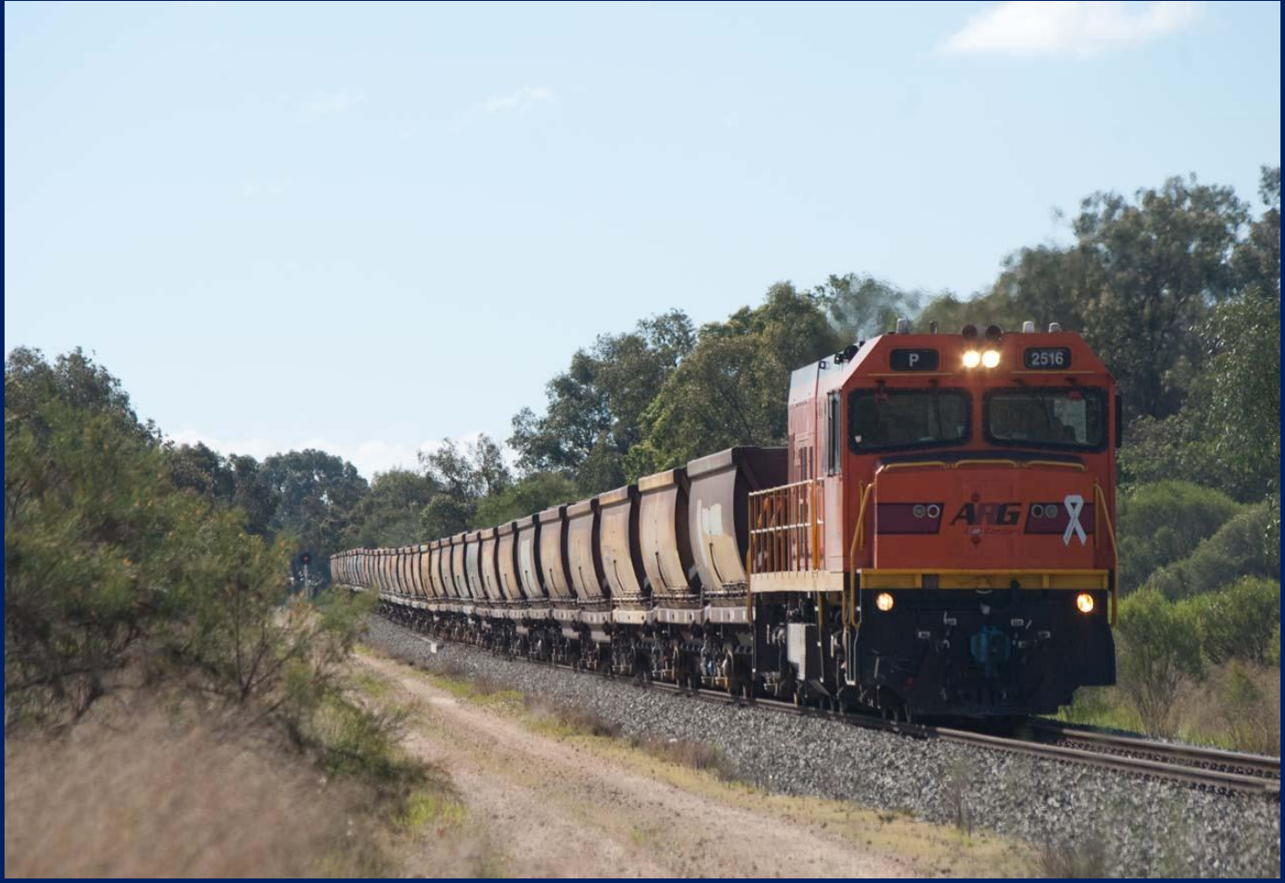
P2516 on 6963 empty bauxite Alumina Junction October 3rd.