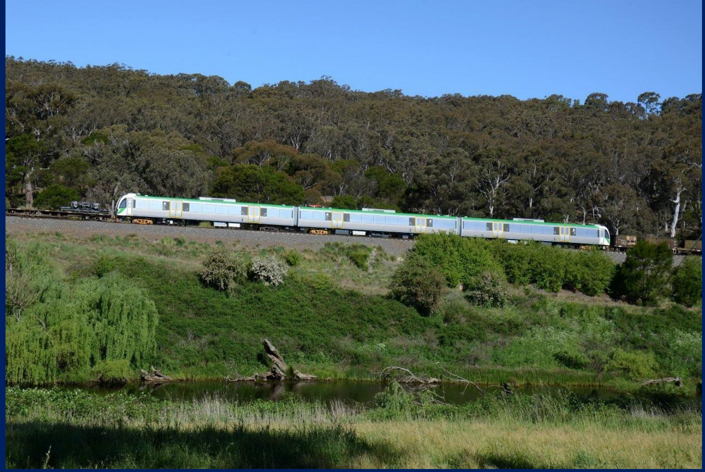
New Transperth EMU set #103 on rear of 4NY3 steel train at Bradfordville NSW 29/10.