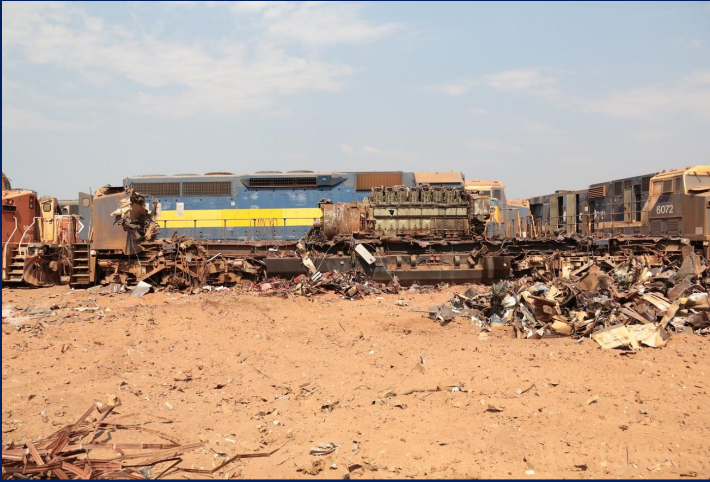
BHPBIO AC6000CW 6071 being scrapped in Sell and Parker scrap yard Wedgefield 27/10.