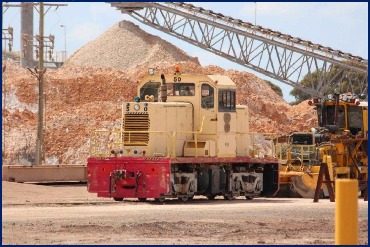
Goninan/GE ex BHP Bo-Bo shunter #50 last used Rawlinna now at Parkeston 19/10.