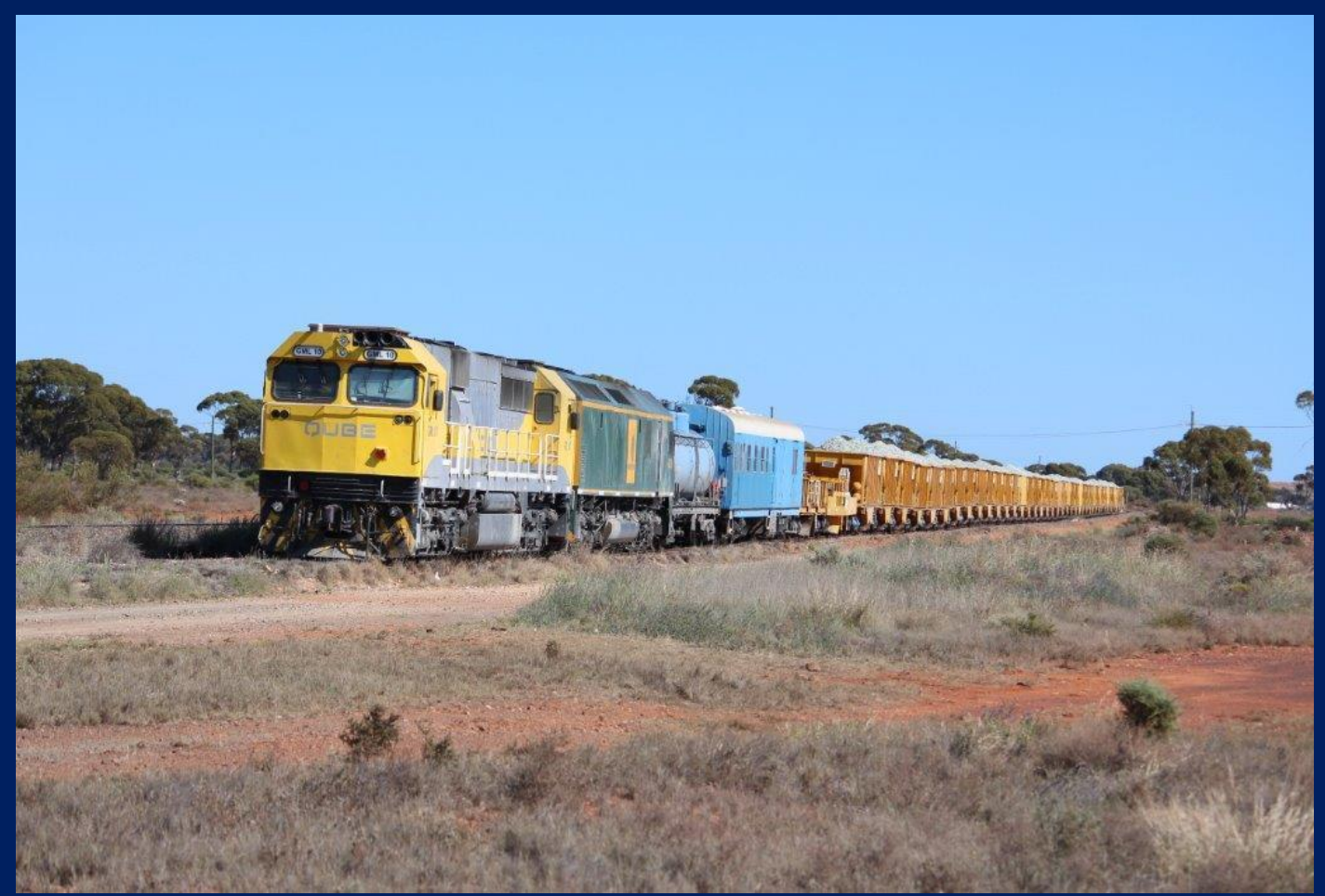
GML10 & RL306 on ballast train stabled in Engineers Siding Parkeston October 4th.