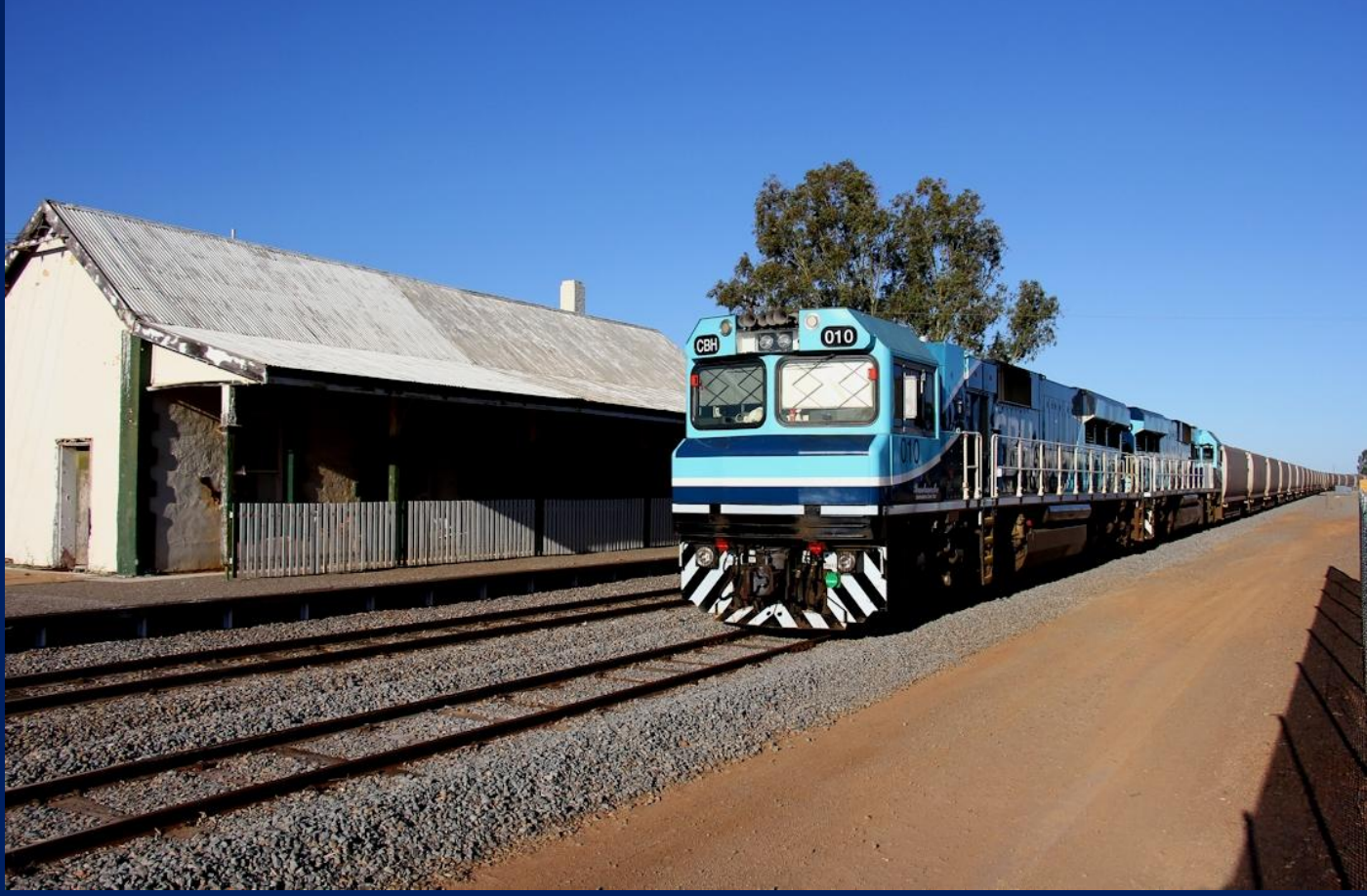
CBH010 & CBH004 stabled adjacent historic MR of WA Mingenew Station October 26th.