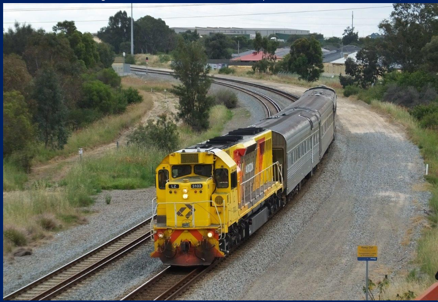
LZ3103 on 2AK2 AK car inspection train to Kwinana at Welshpool on 20/10.