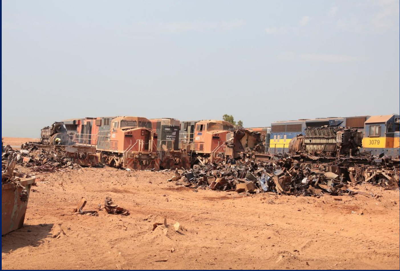
SD40R and AC6000CW being scrapped in Wedgefield scrap yard 27/10.