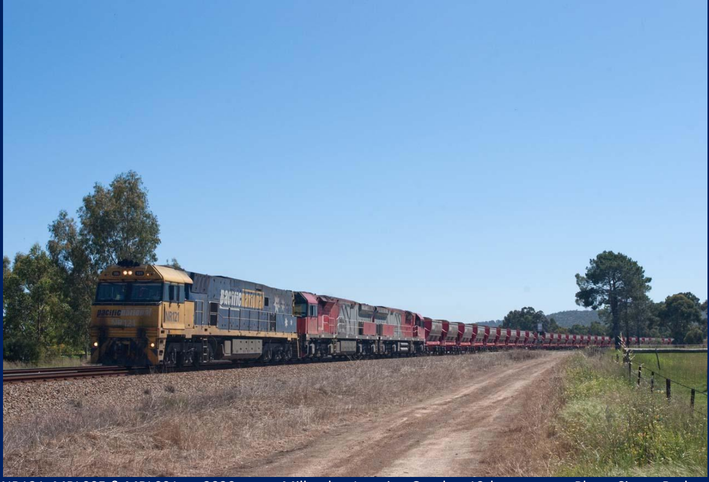
NR121, MRL005 & MRL001 on 2030 ore at Millendon Junction October 13th.