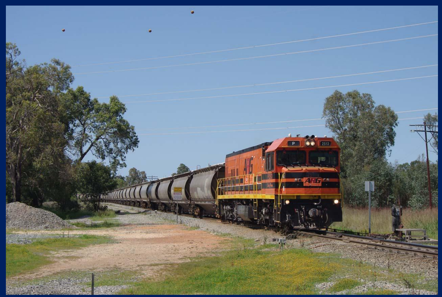
P2513 on 4222 alumina at Alumina Junction October 1st.