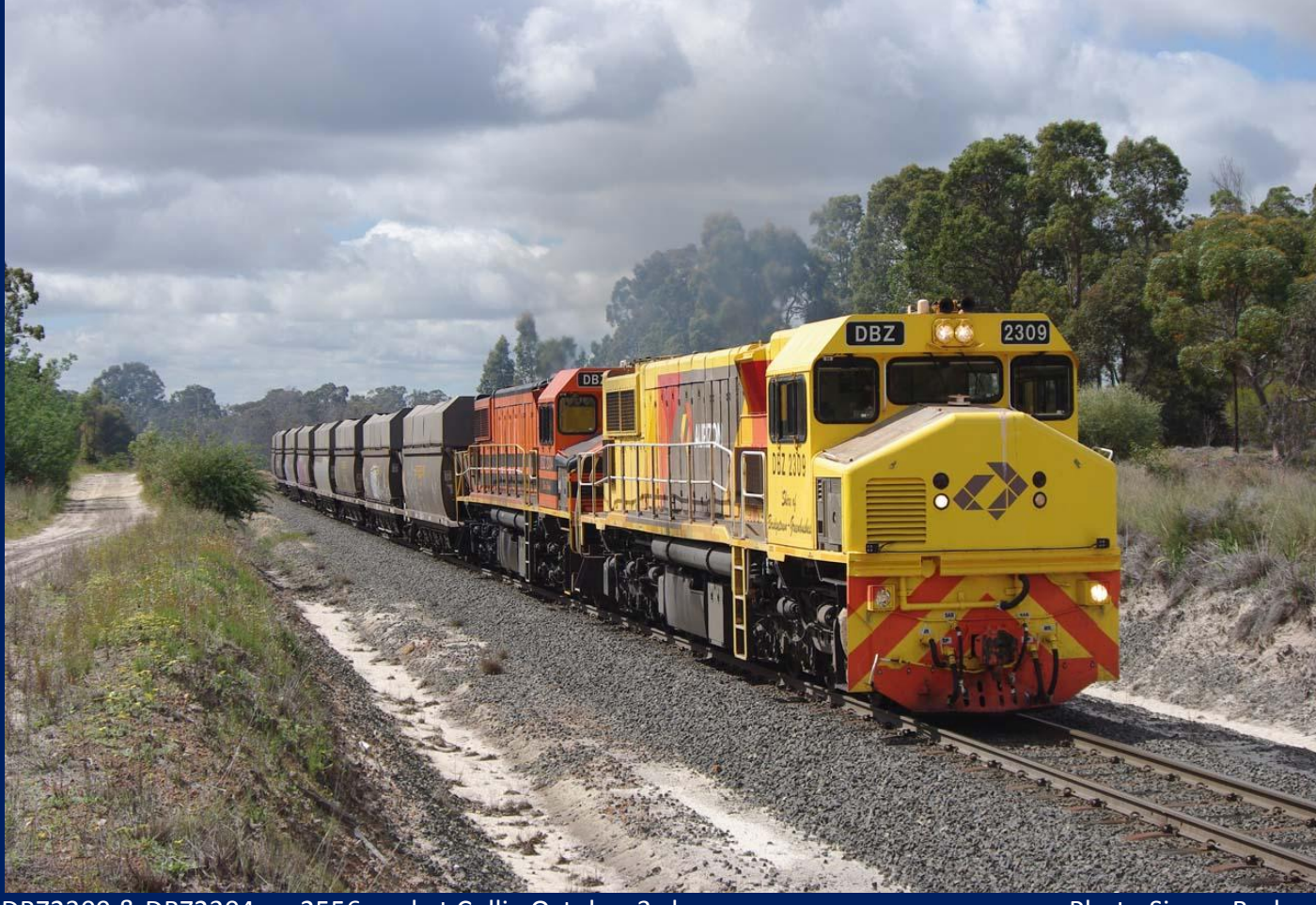
DBZ2309 & DBZ2304 on 2556 coal at Collie October 3rd.