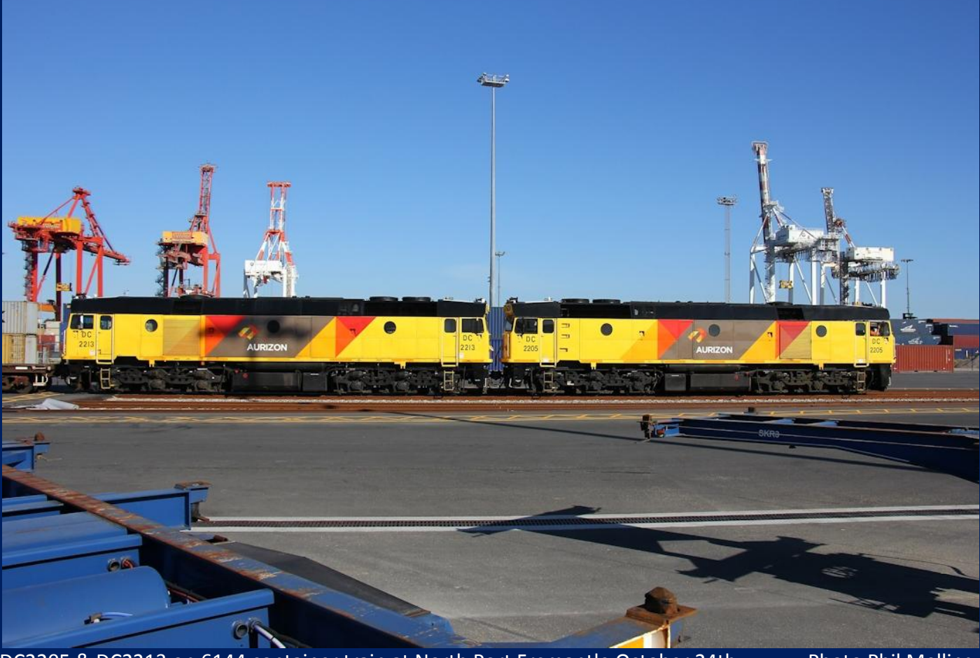
DC2205 & DC2213 on 6144 container train at North Port Fremantle October 24th.