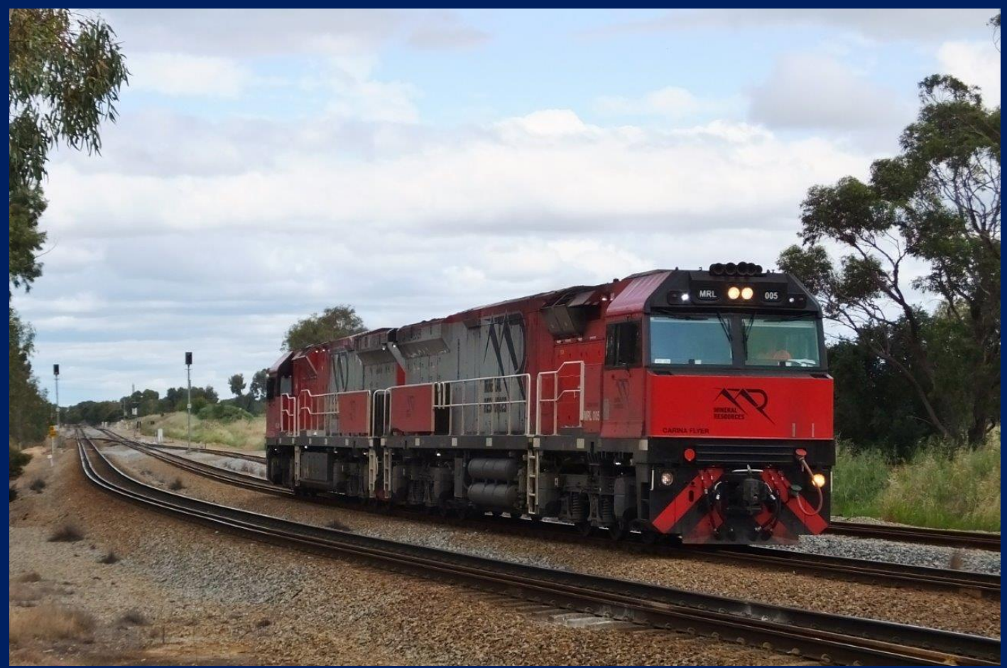
MRL005 & MRL001 on 7PN1 light engine to Moondyne to attach stowed ore 18/10.