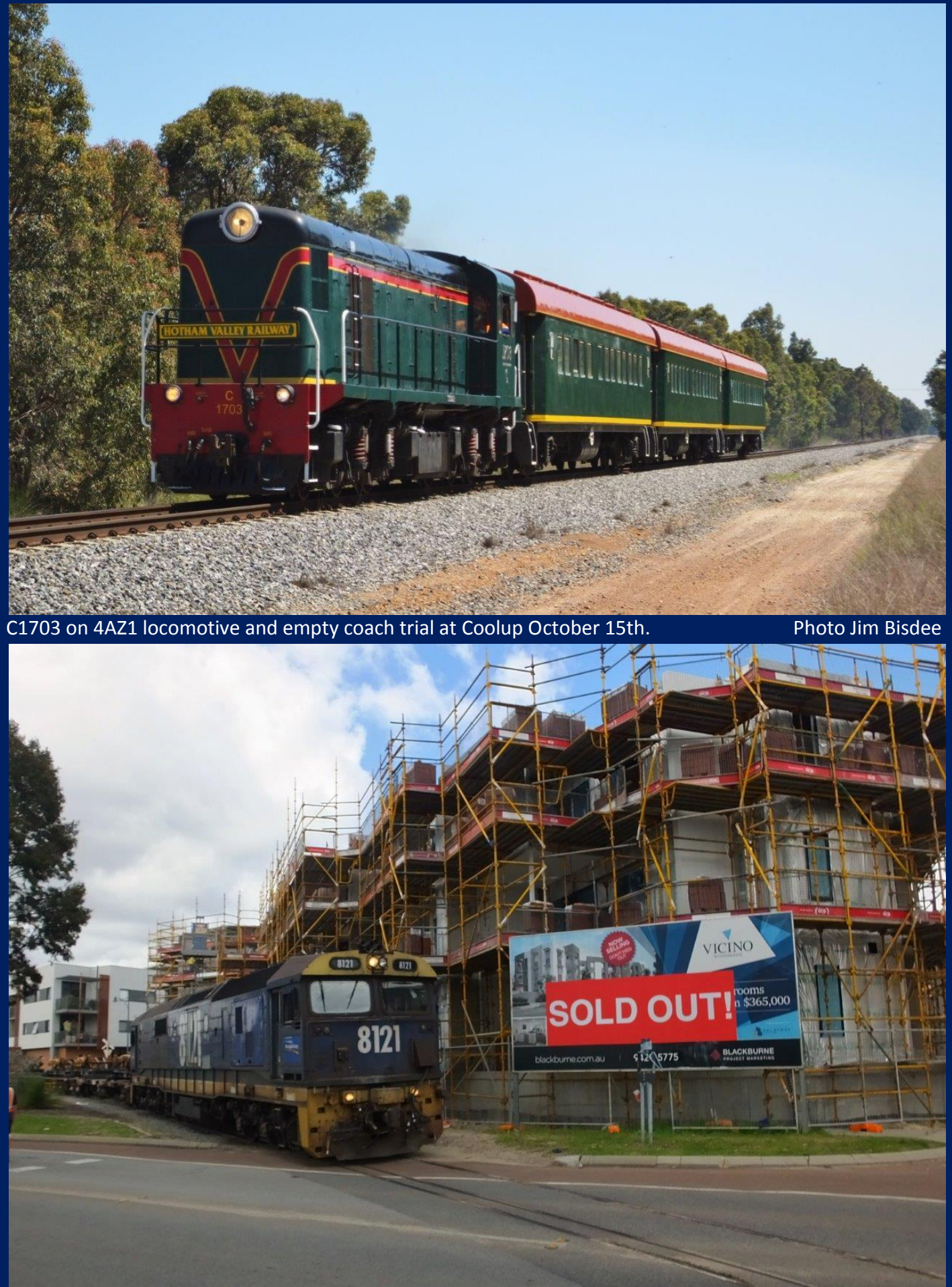
8121 on 6P31 EMU transfer bogies on flattops departing old workshops Midland 3/10.