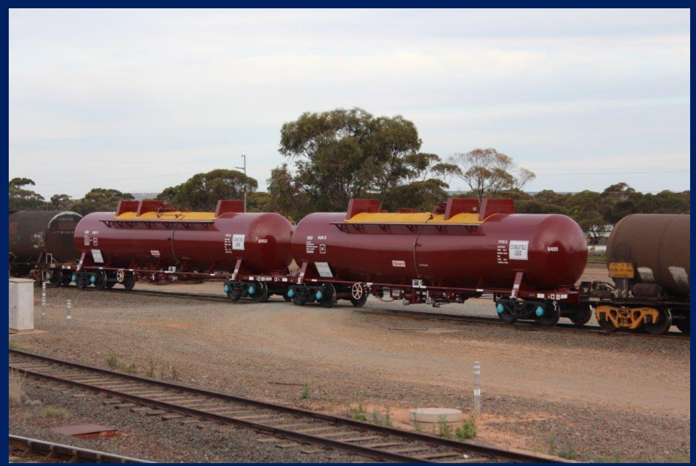
Caltex NTAY tankers under going certification by BP [used on BP fuel train] at West Kalgoorlie 27/10.