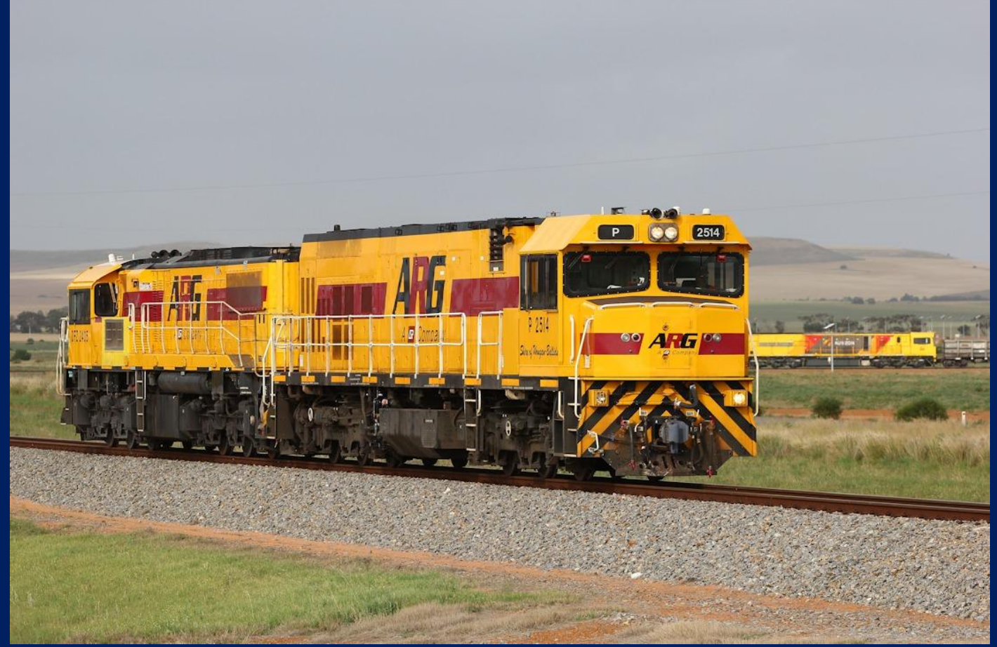
P2514 hauling DFZ2405 from Narngulu East to Narngulu to be stowed October 5th. Pho