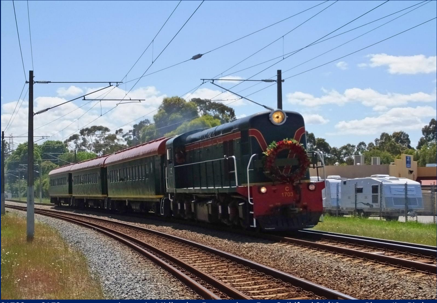
C1703 on 6AZ3 commemoration train Midland to Fremantle at East Guildford 31/10.