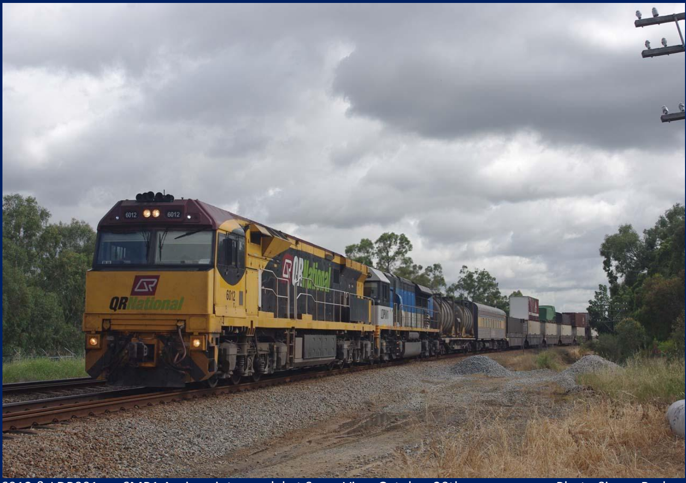
6012 & LDP001 on 6MP1 Aurizon intermodal at Swan View October 20th.