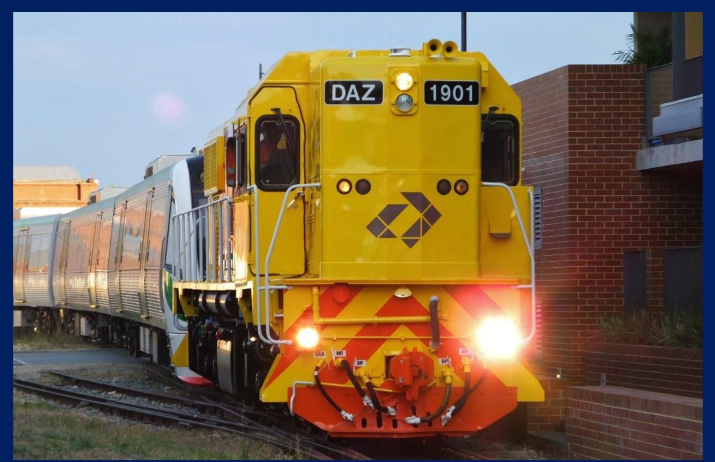
DAZ1901 on 6163 hauling EMU B series #102 out of old workshops to deliver to PTA at Midland 17/10.