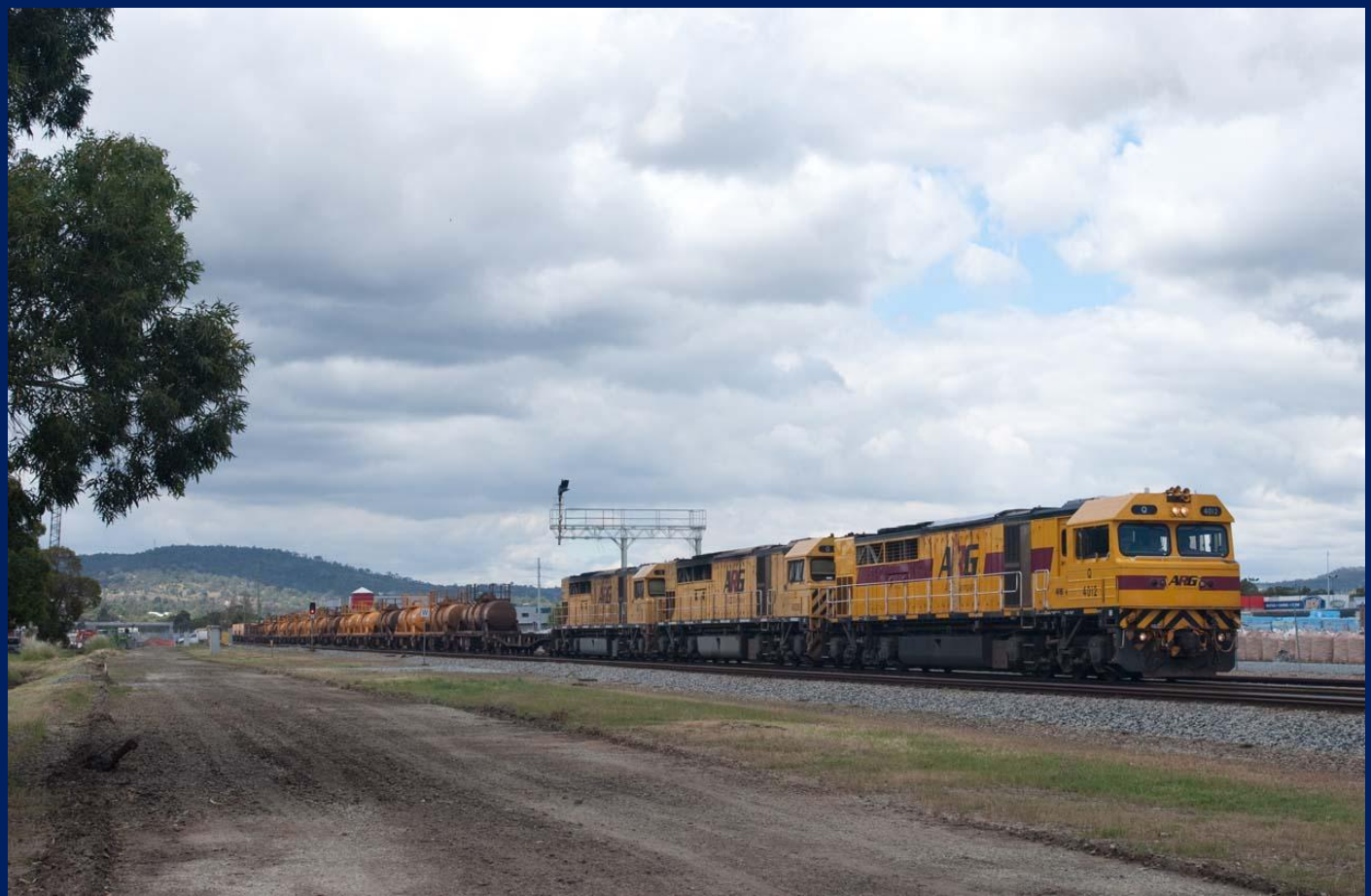
Q4012, Q4008 & Q4011 on 1426 Kalgoorlie freight at Midland October 20th.