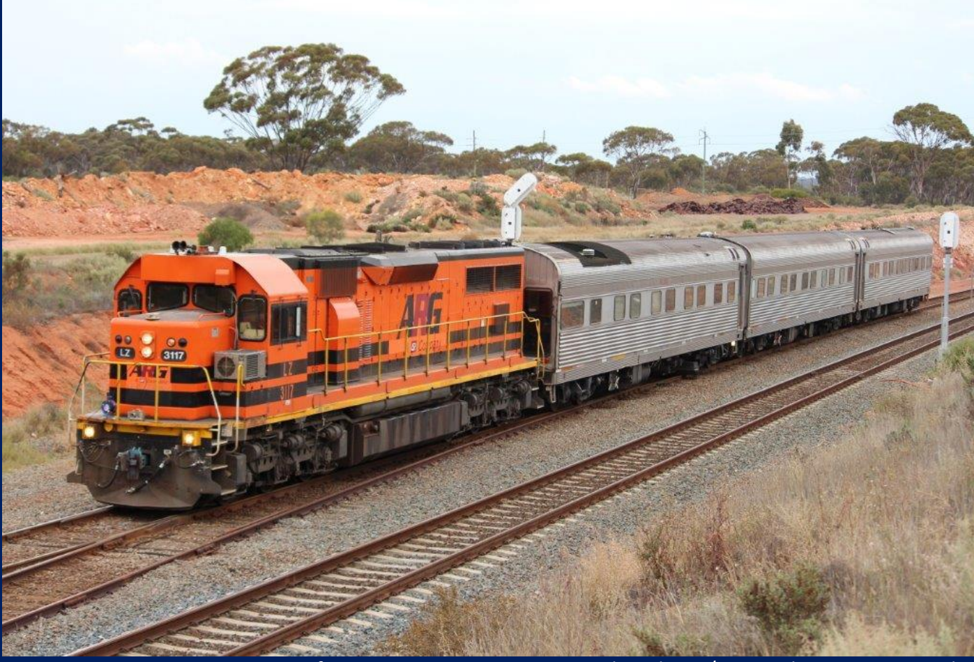
L3117 on 7AK2 AK inspection train from Esperance arriving West Kalgoorlie 18/10.