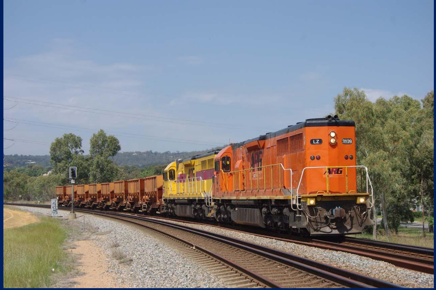
LZ3109 & LQ3121 on 6062 trial and 7 CFCLA empty ore cars ex Avon at Midland 17/10.