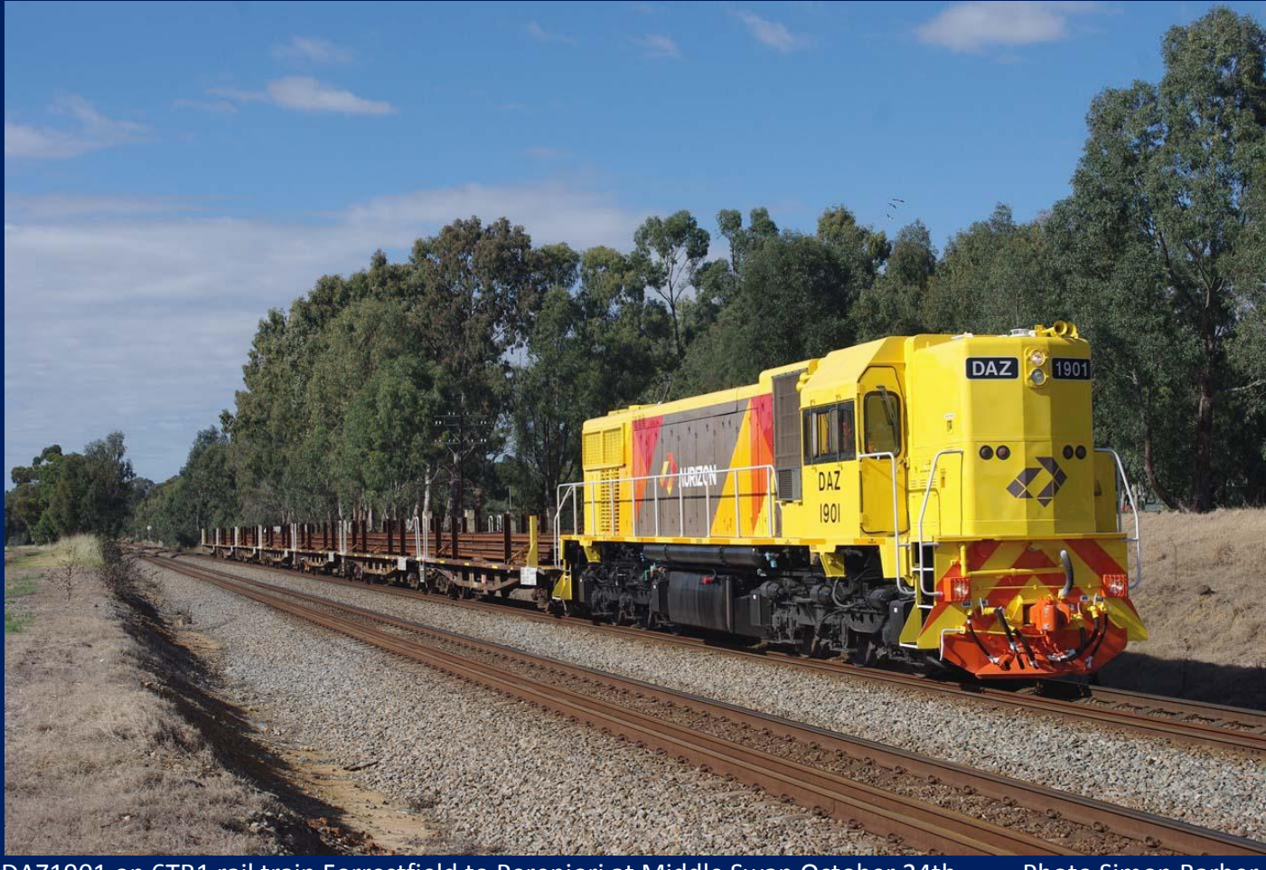
DAZ1901 on 6TR1 rail train Forrestfield to Perenjori at Middle Swan October 24th.