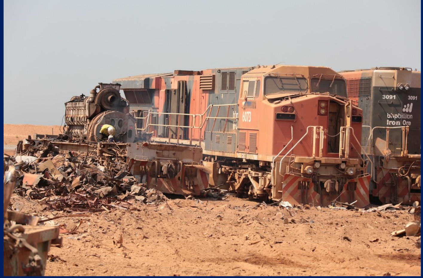
SD40R being scrapped beside AC6000CW and SD40R Wedgefield on 27/10.