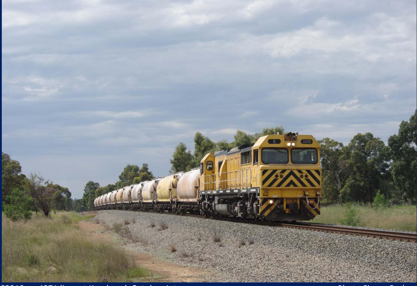
S3310 on 4271 lime at Keysbrook October 1st.