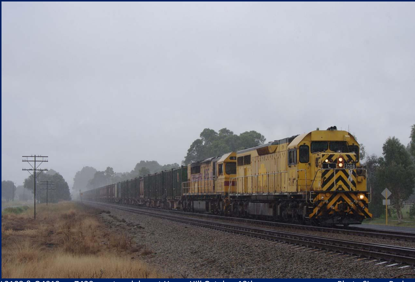
L3108 & Q4019 on 7430 empty sulphur at Herne Hill October 19th.