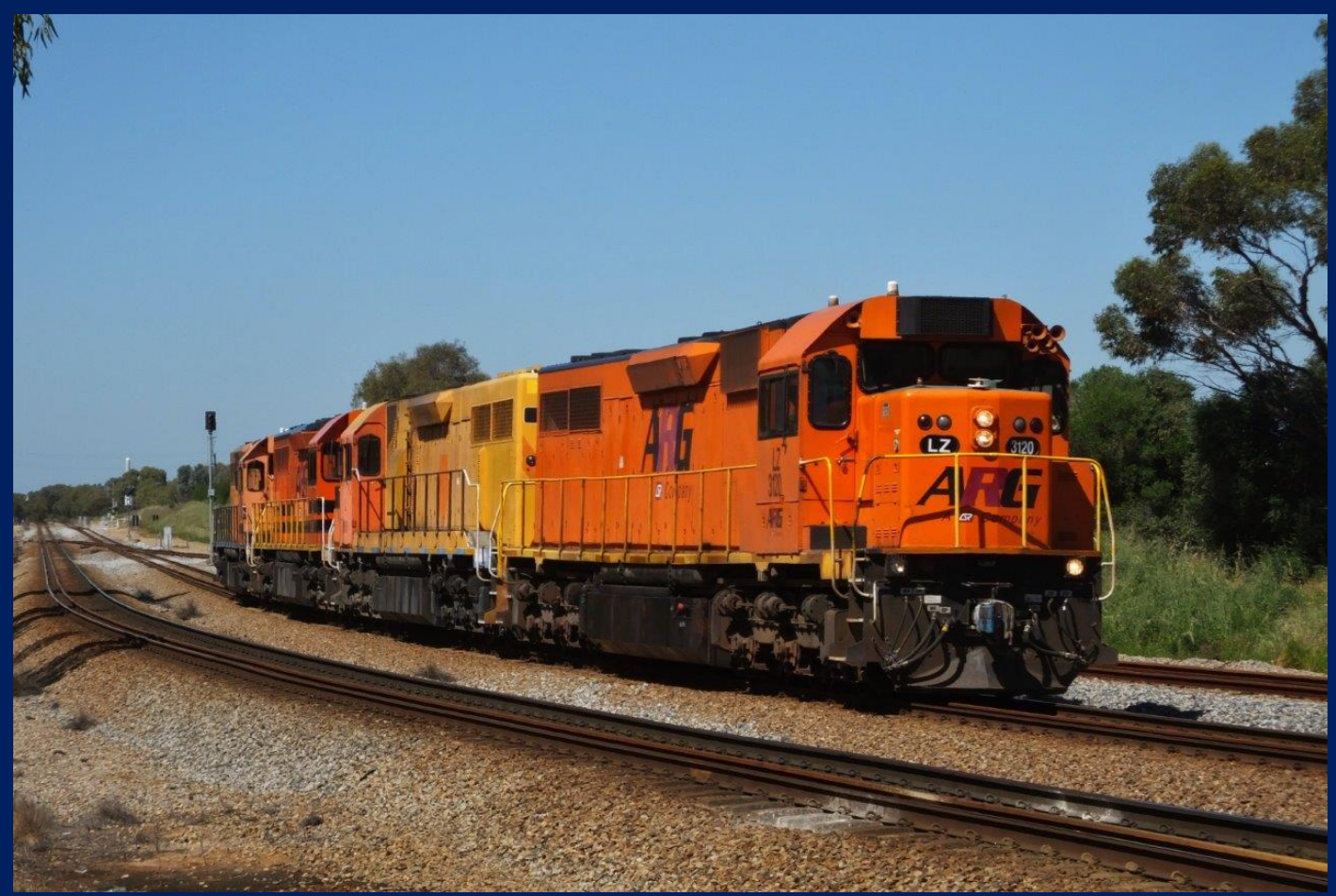
L3120 last run on 6061 hauling L3116, LZ3105 & L3113 to Avon Yard to be stored 10/10.