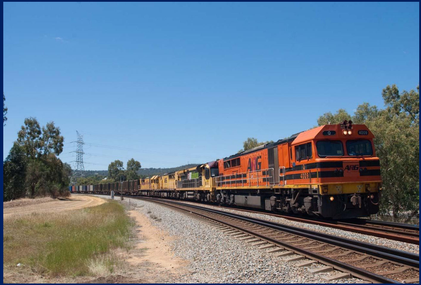
Q4009, ACA6009, Q4007 & Q4010 on combined 2430/2426 freight at Bellevue 21/10.