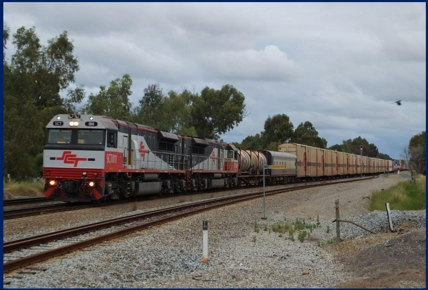
SCT011 & SCT008 on 1PM9 SCT freight at Woodbridge November 9th.