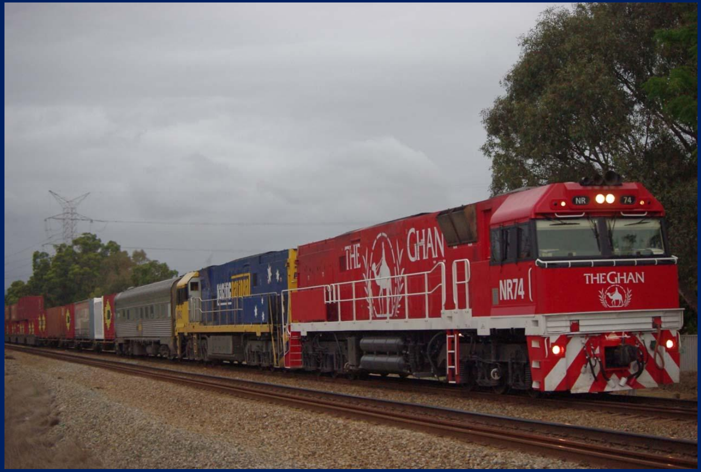
NR74 & NR42 on 3PS6 intermodal at Swan View November 18th.