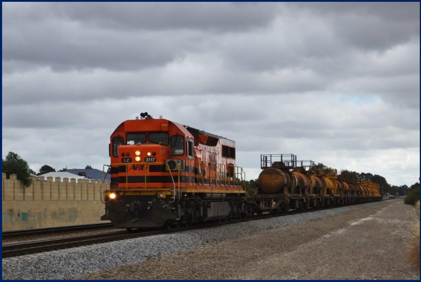
LZ3117 on 5167 empty acid tankers Kwinana to Forrestfield at Thornlie November 6th.