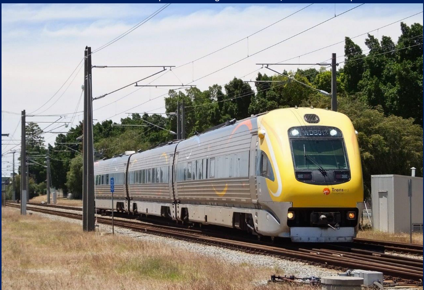
Three car Prospector railcars crossing over to enter Bassendean siding then run to Midland 18/11.