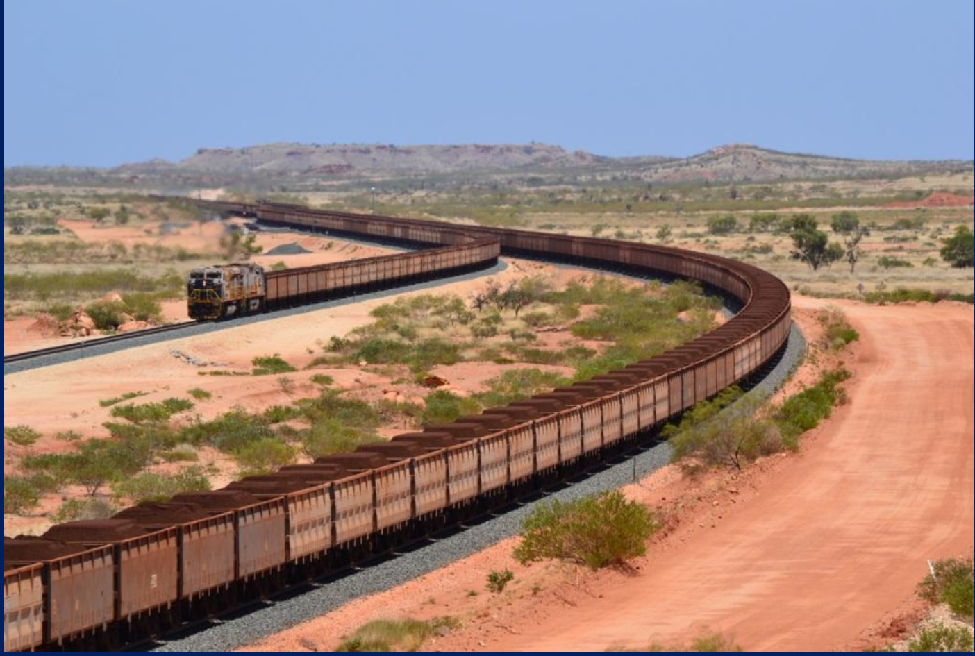
705 & 719 on Cloudbreak loaded passing 702 & 014 going on Solomon Branch 26/11.