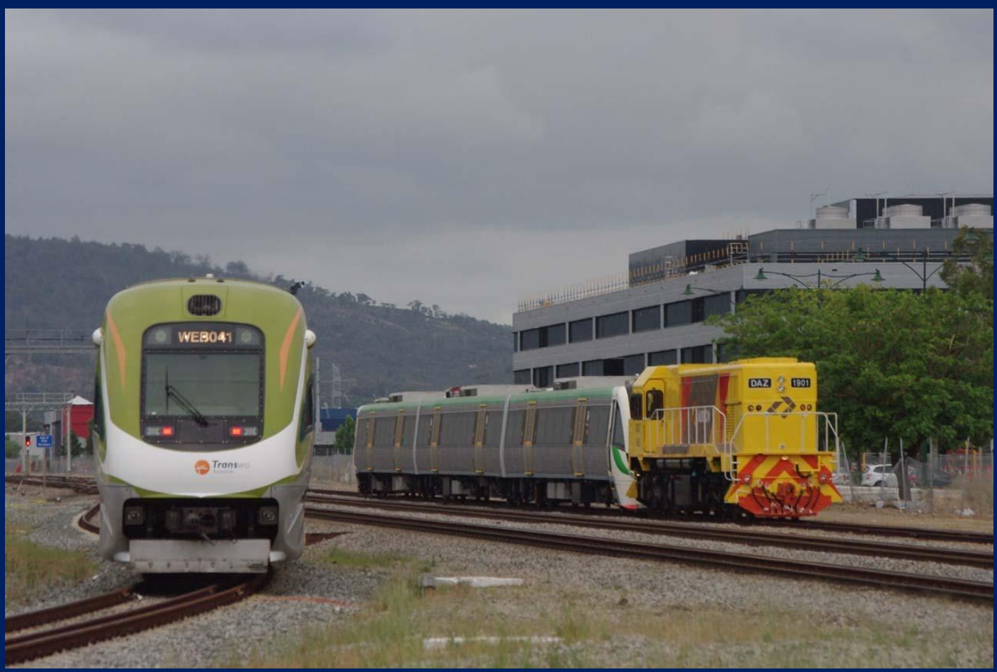
Departing Avonlink passing DAZ1901 EMU set #103 in dual gauge loop Midland 28/11.