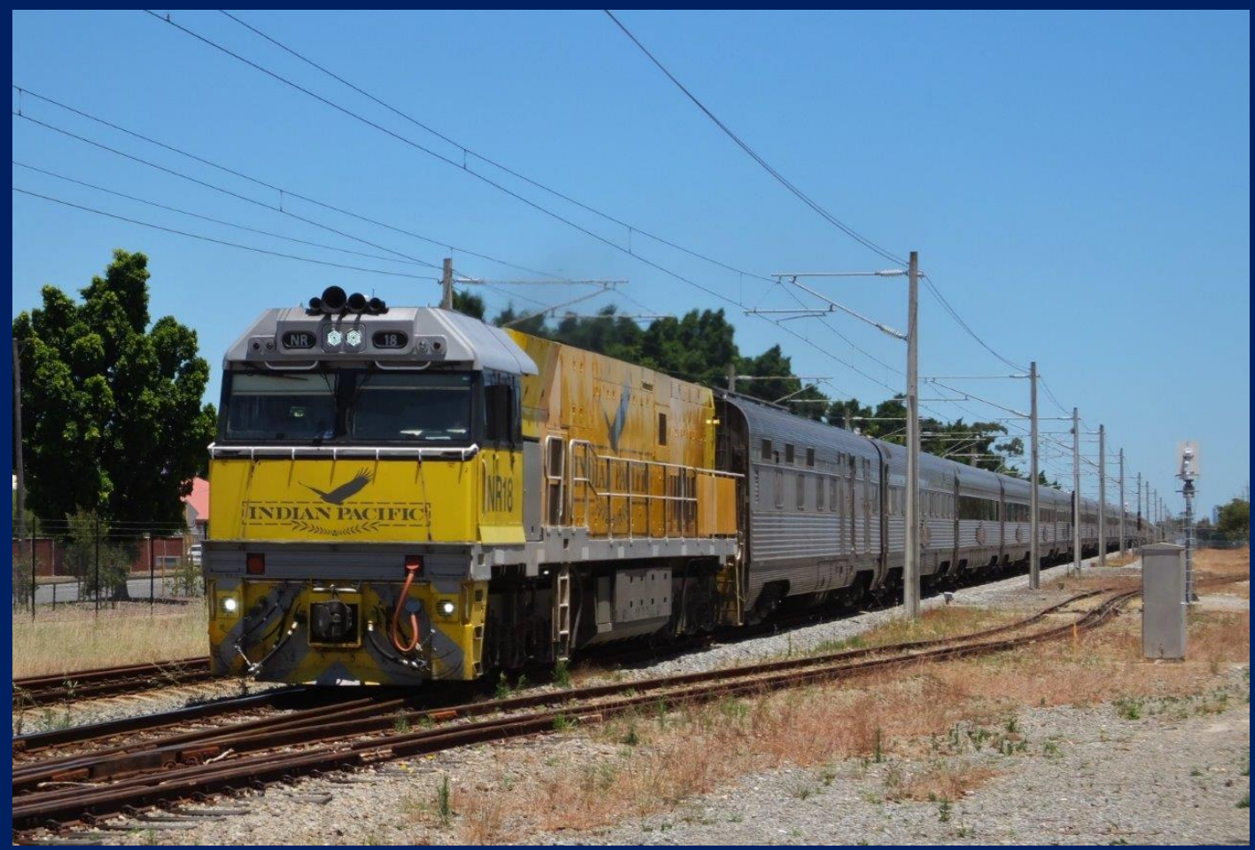
NR18 on 1PA8 Indian Pacific at about to pass UGL siding Bassendean 18/11.