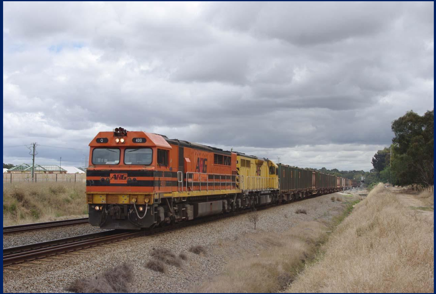
Q4001 & L3115 on 6430 empty sulphur at Hazelmere November 22nd.