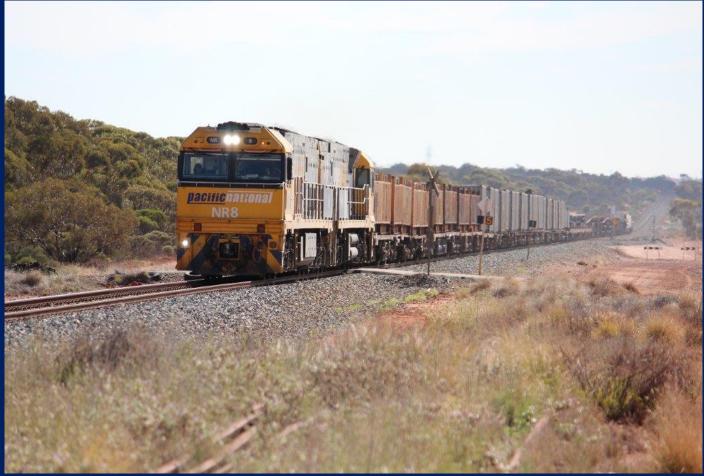
NR8 & NR60 on 5MP2 [ex 4WP2] steel Binduli with PTA EMU set #103 on rear 2/11.