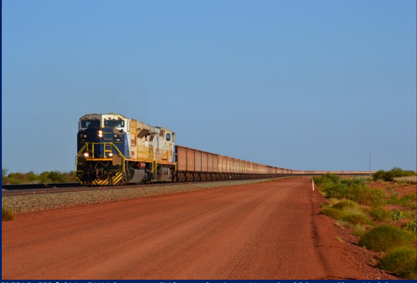
SD70ACe 702 & 014 a CW44-9 on empty FMG ore at Canning on November 26th.