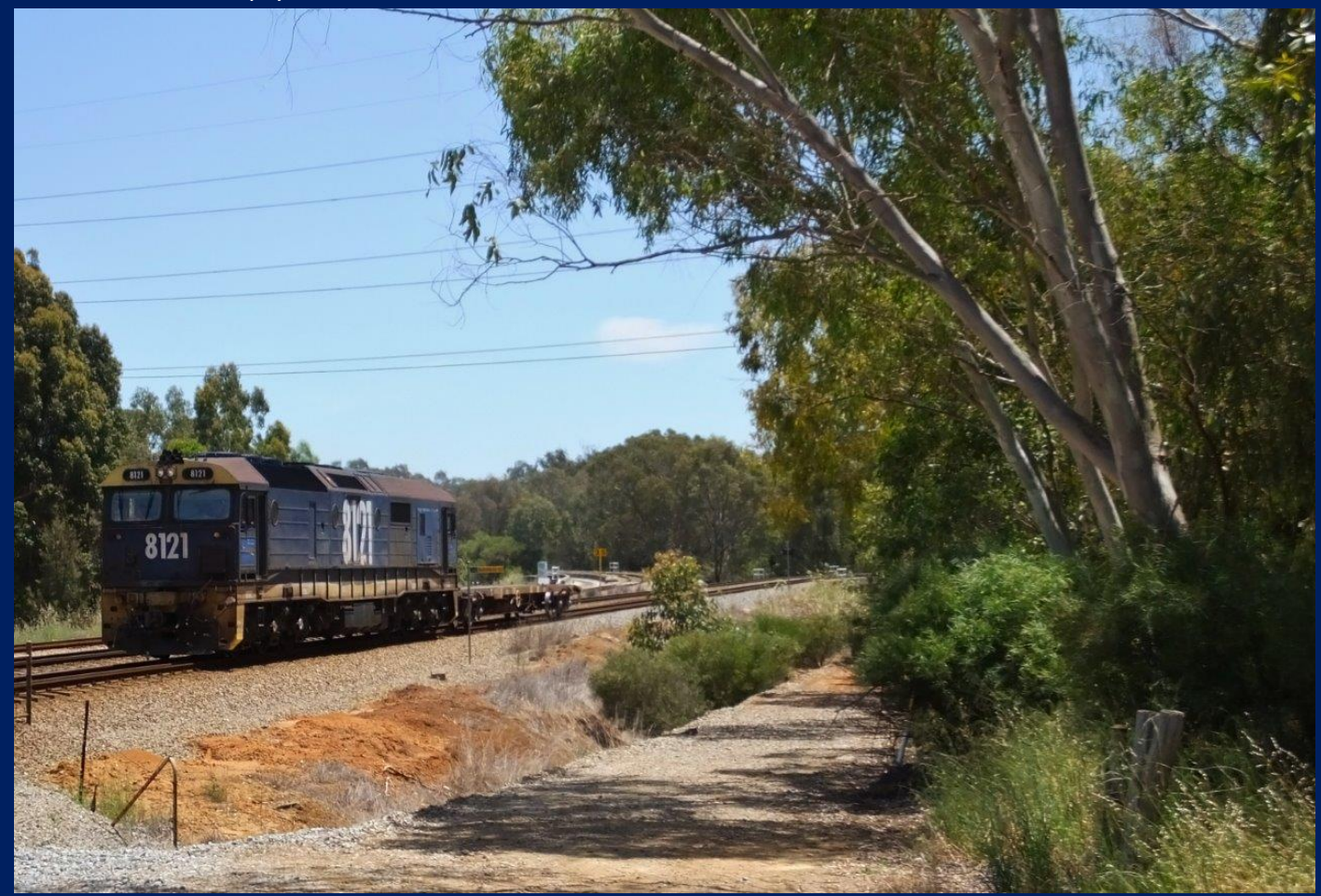
8121 on 3P32 shunter Midland to Kewdale at Woodbridge November 4th.