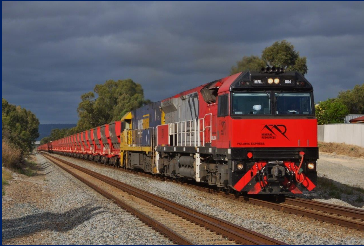
MRL004 & NR121 on 5030 Polaris ore at Thornlie November 6th.