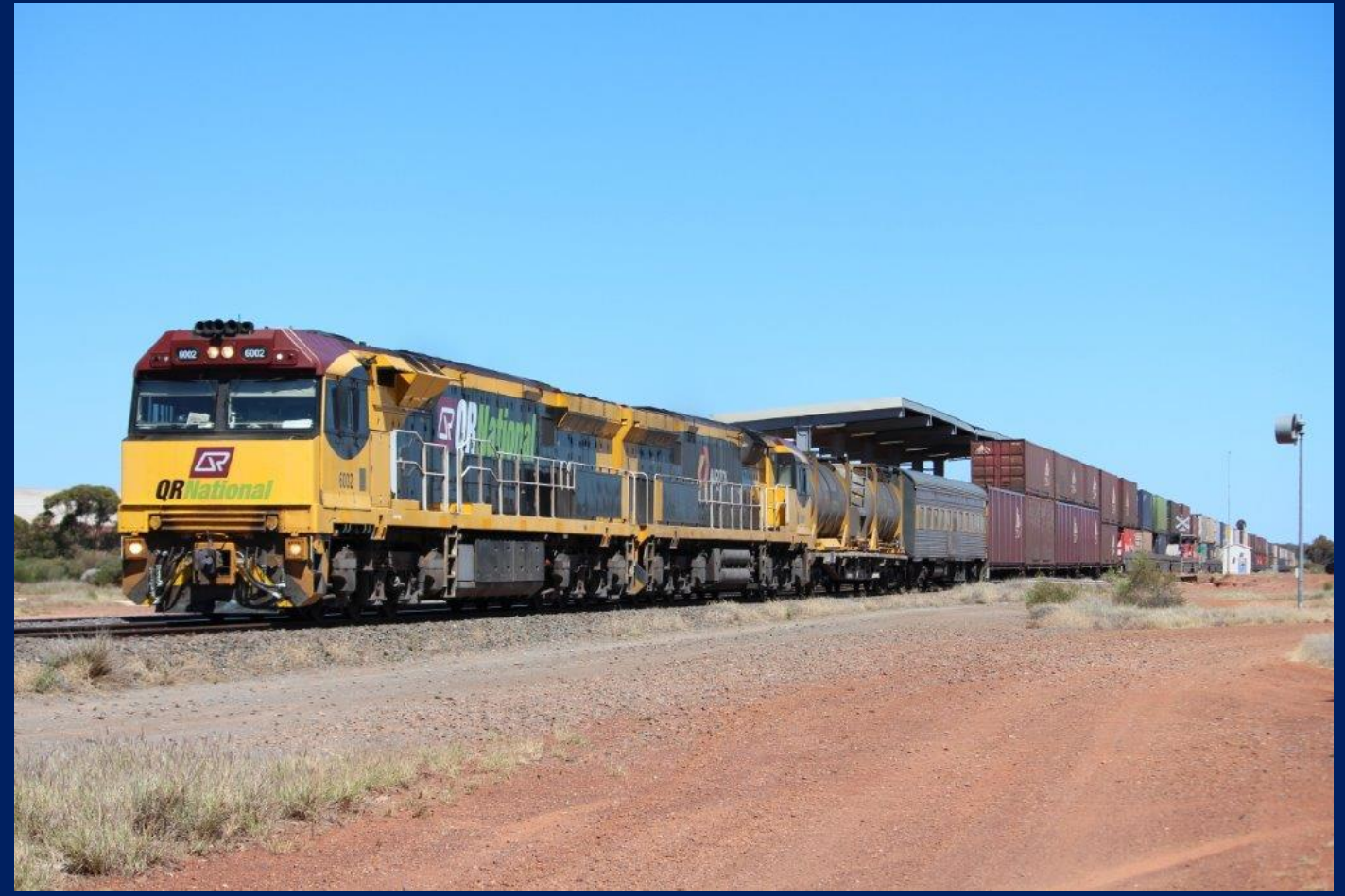
6002 [no longer ACA6002] & 6008 on 6MP1 Aurizon intermodal at Parkeston 23/11.