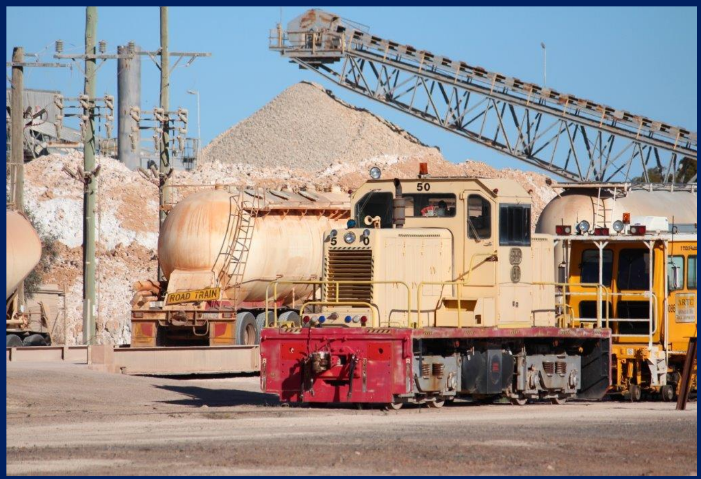
Former BHP Goninan shunter #50 at Loongana Lime Parkeston plant November 3rd.