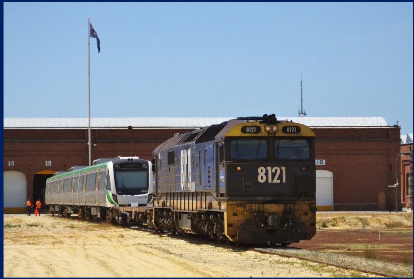
8121 on 3P31 propelling EMU set 103 into 6 road old workshops for fitting of its powered bogies 4/11.