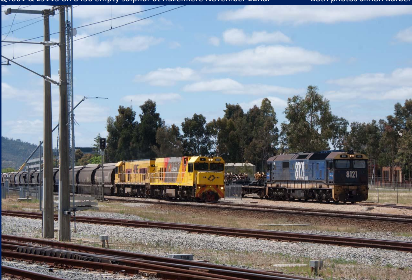
8121 on 6P32 P/N shunter being passed by P2517 & P2511 on 6K06 Watco/CBH grain Midland 14/11.