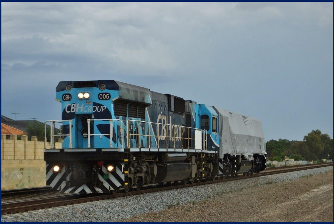
CBH005 hauls new CBH023 from North Port to Gemco Forrestfield for commissioning at Thornlie 27/11.