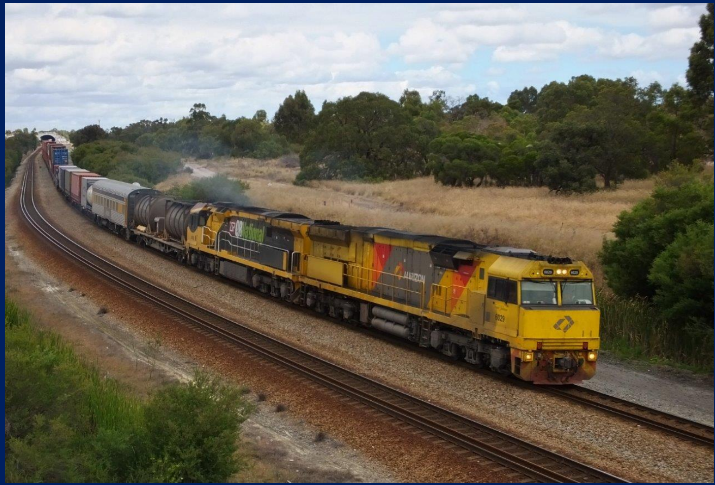
6029 & 6006 on 7PM1 Aurizon intermodal South Guildford November 22nd.