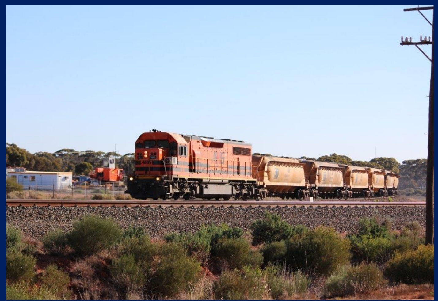
L3110 on 7438 nickel from Hampton on east leg Binduli triangle on way WEK 24/11.