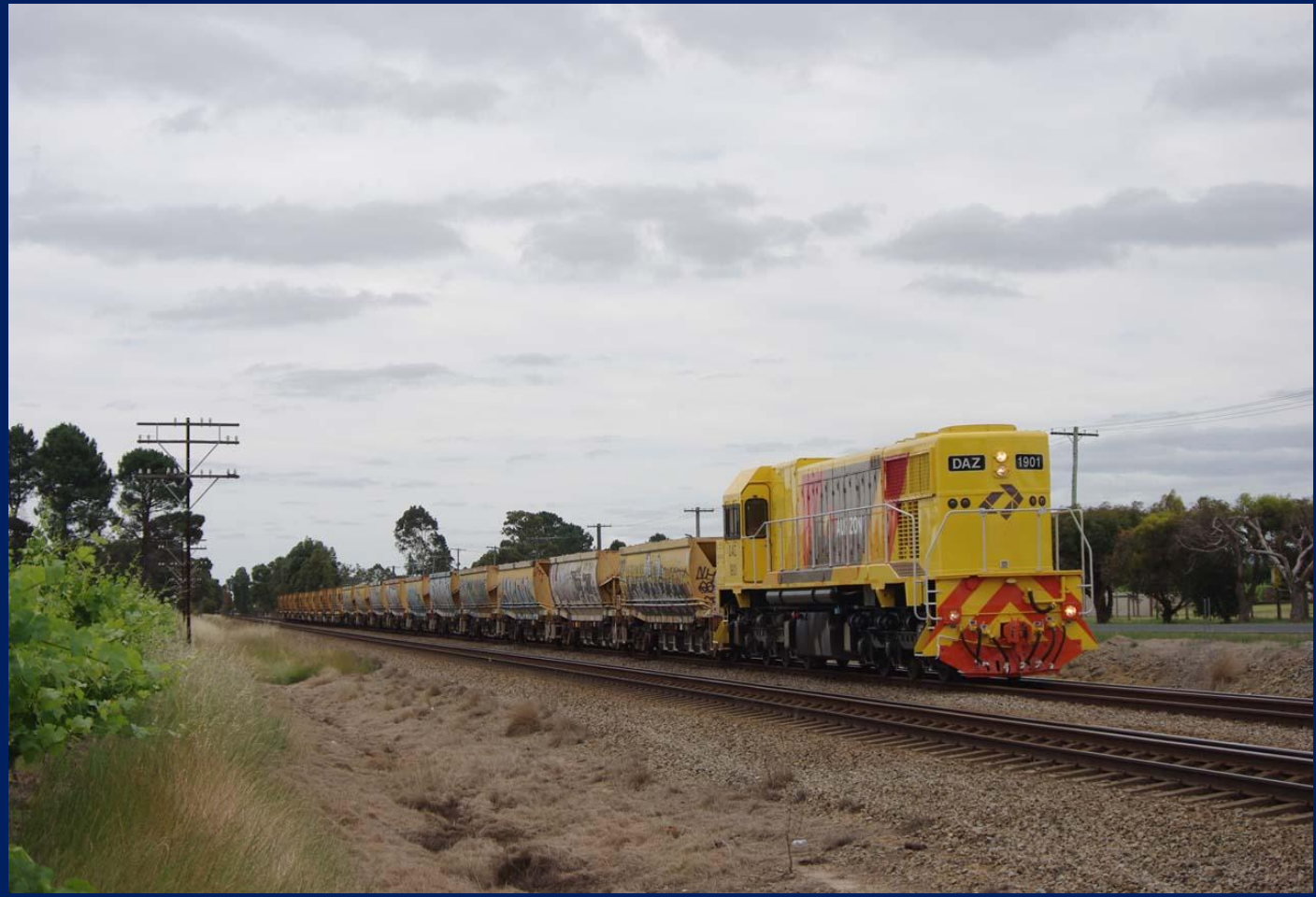
DAZ901 on 5BT4 empty ballast wagons on way to Kwinana for service November 6th.