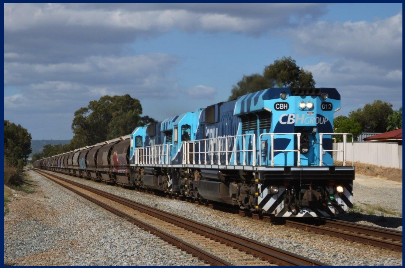
CBH0012 & CBH002 on 6K06 Watco/CBH grain at Thornlie November 7th.