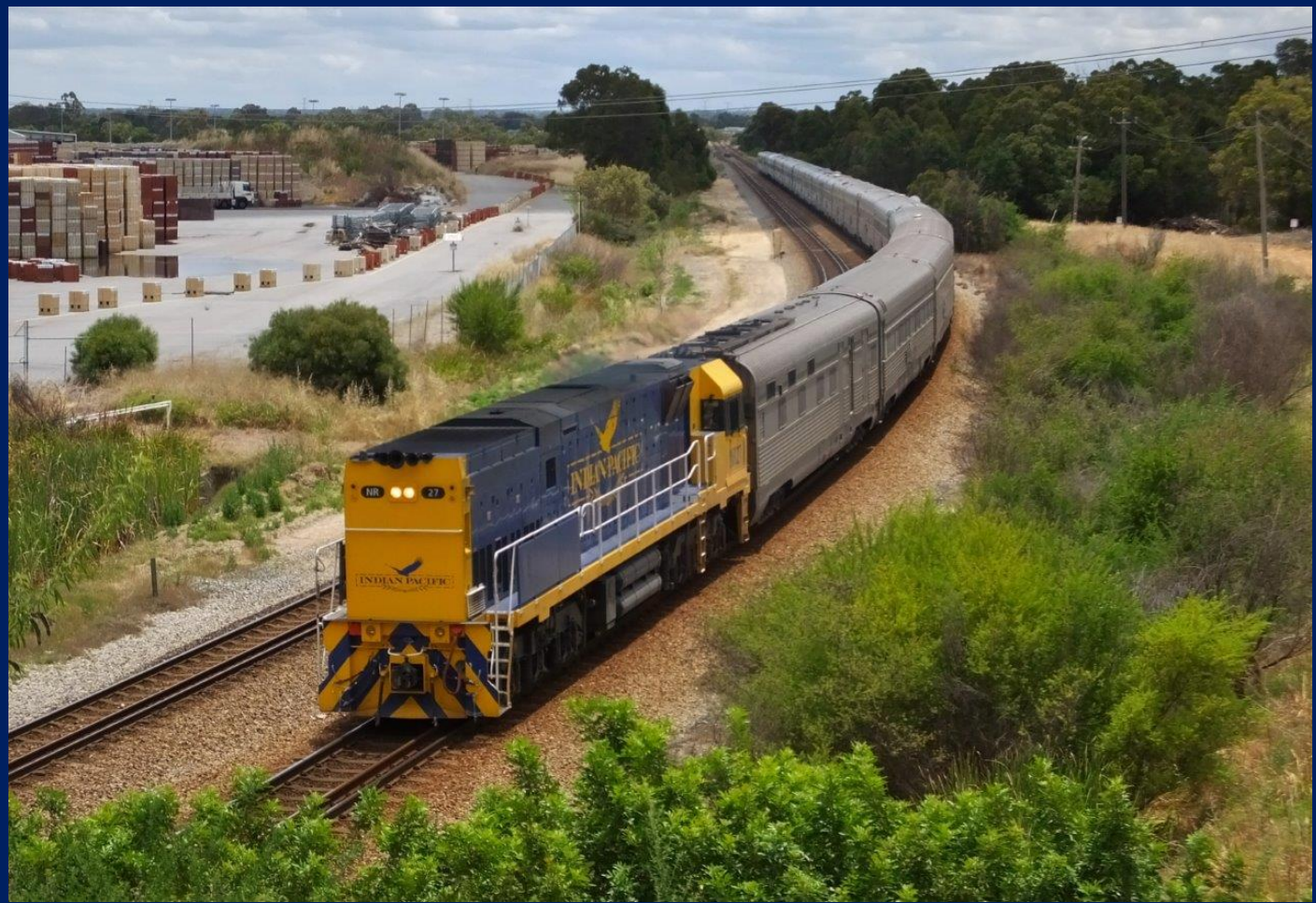
NR27 on 7003 empty Indian Pacific cars East Perth to Kewdale at South Guildford 22/11.