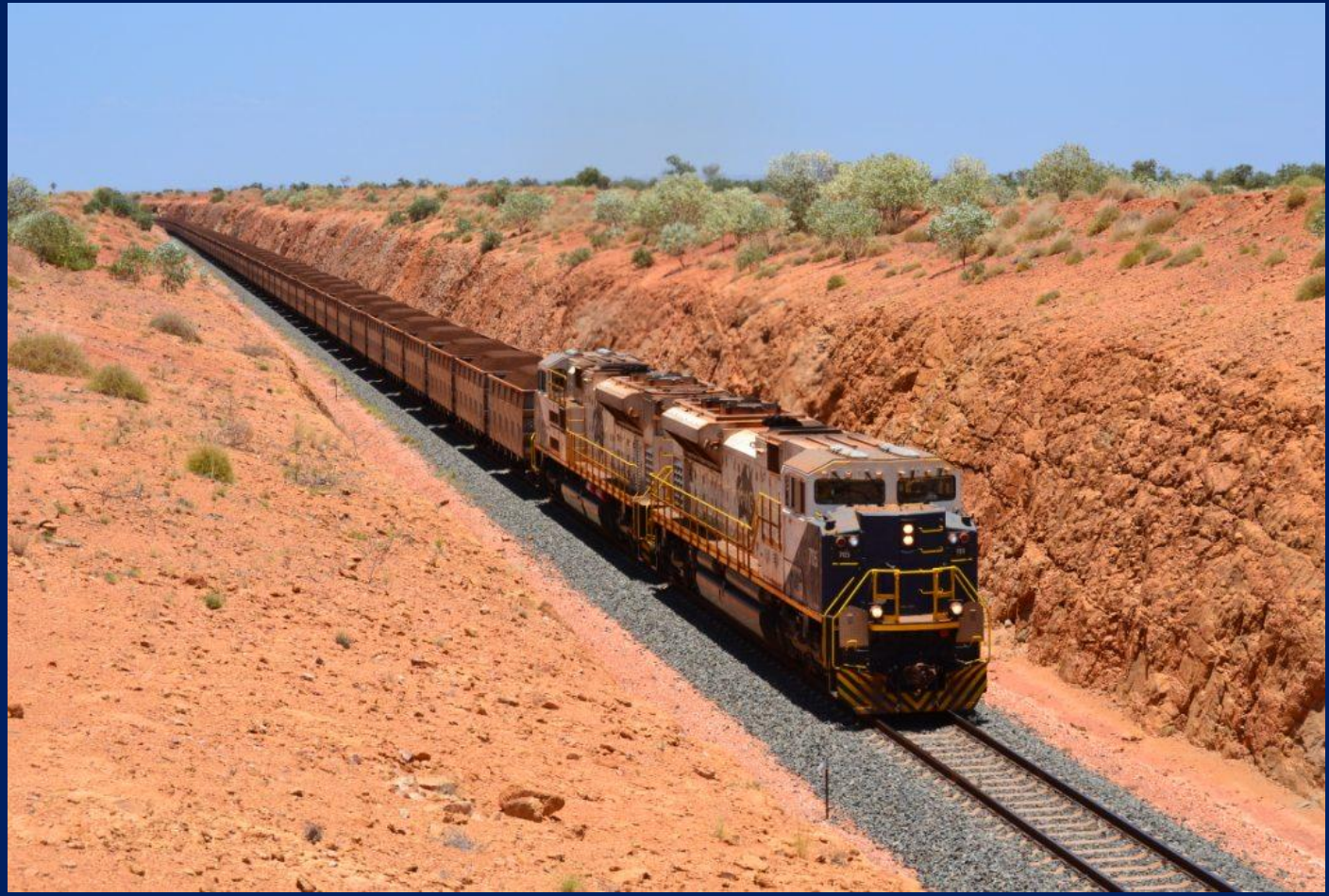
FMG 705 & 719 approaching Marble Bar Road crossing Woodstock November 26th.