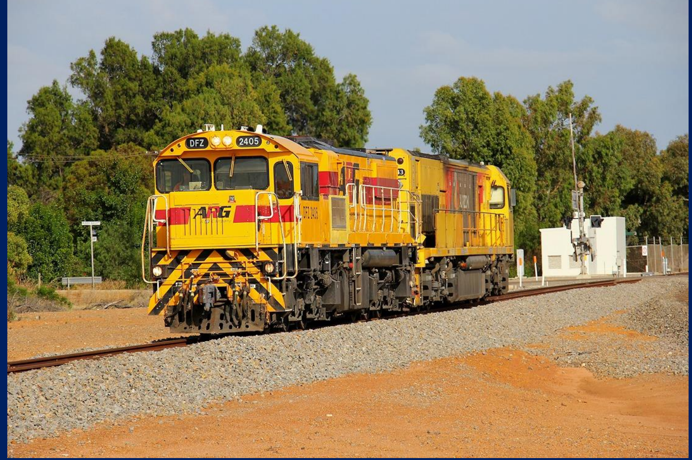
DFZ2405 & ACN4143 on 2754 light engine departing Narngulu for Forrestfield 10/11.