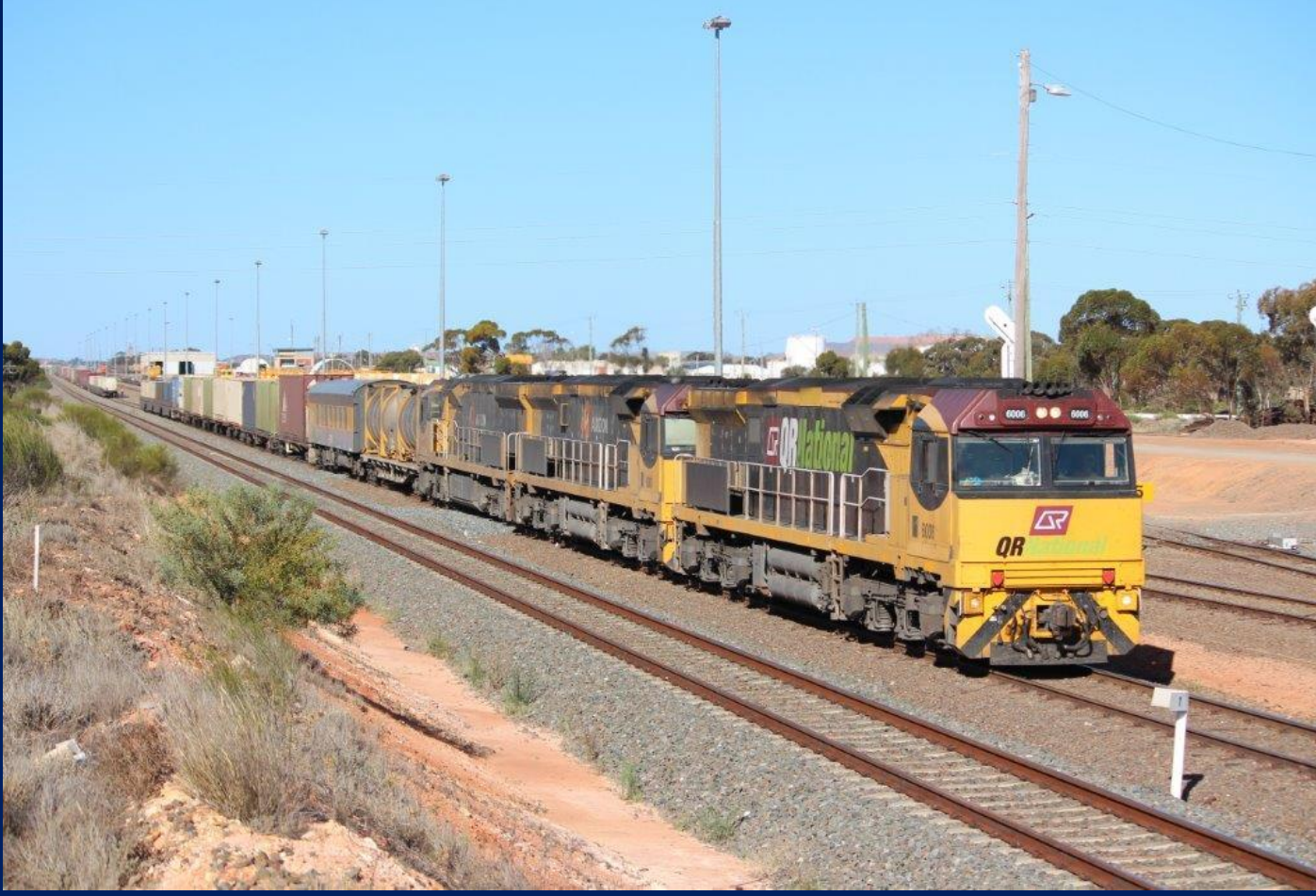
6006, 6003 & dead failure 6004 on 7PM1 shunting at West Kalgoorlie 24/11.