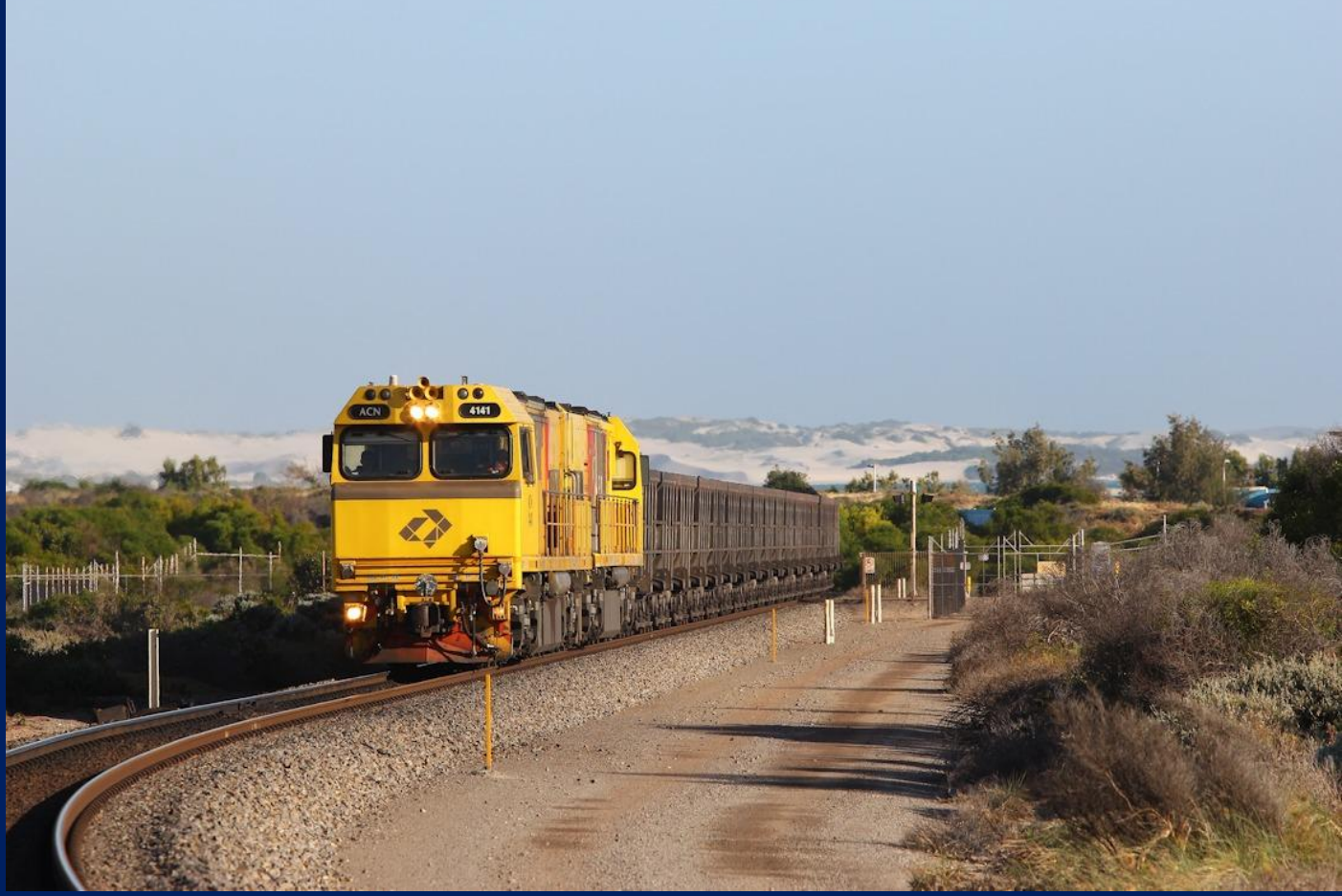
ACN4141 & ACN4152 on 7763 Karara ore near journeys end at Beachlands 8/11.