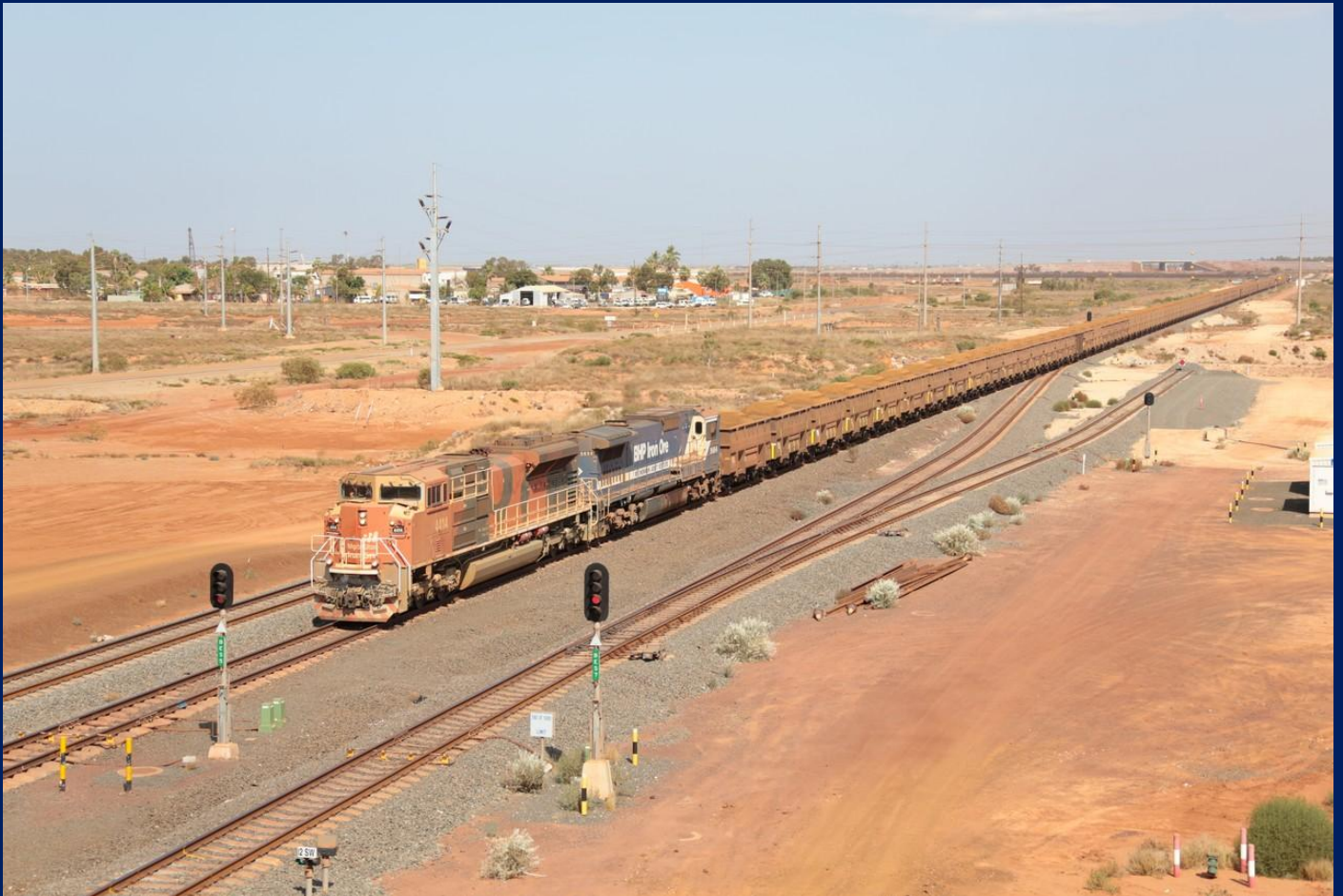
SD70ACe 4314 & CM40-8M 5654 on a loaded ore approaching Boodarie on November 7th.