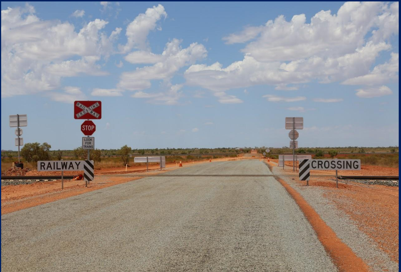
Roy Hill line grade crossing on Wodgina Road looking east to FMG crossing in the distance 23/11.