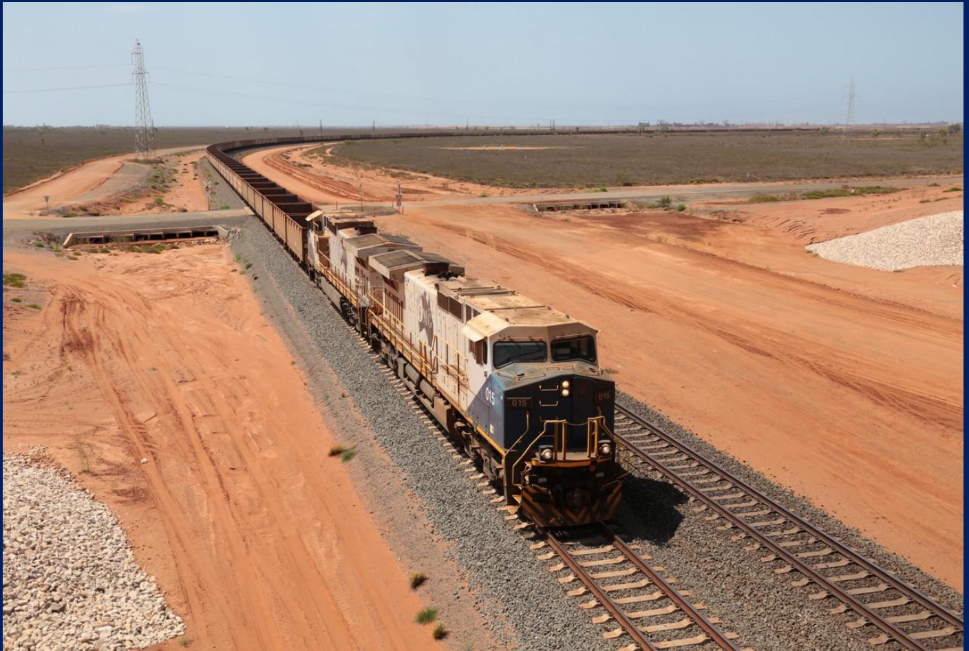
44-9CW 015 & 008 on empty ore rake rounding curve at 5km peg after leaving port unloaders 7/11.