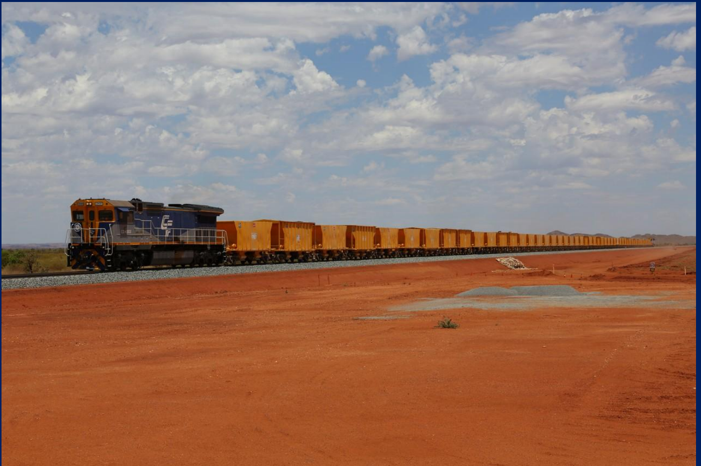
CFCLA CM40-8 CD4303 on a ballast train running north at Wodgina Road on the Roy Hill line 23/11.