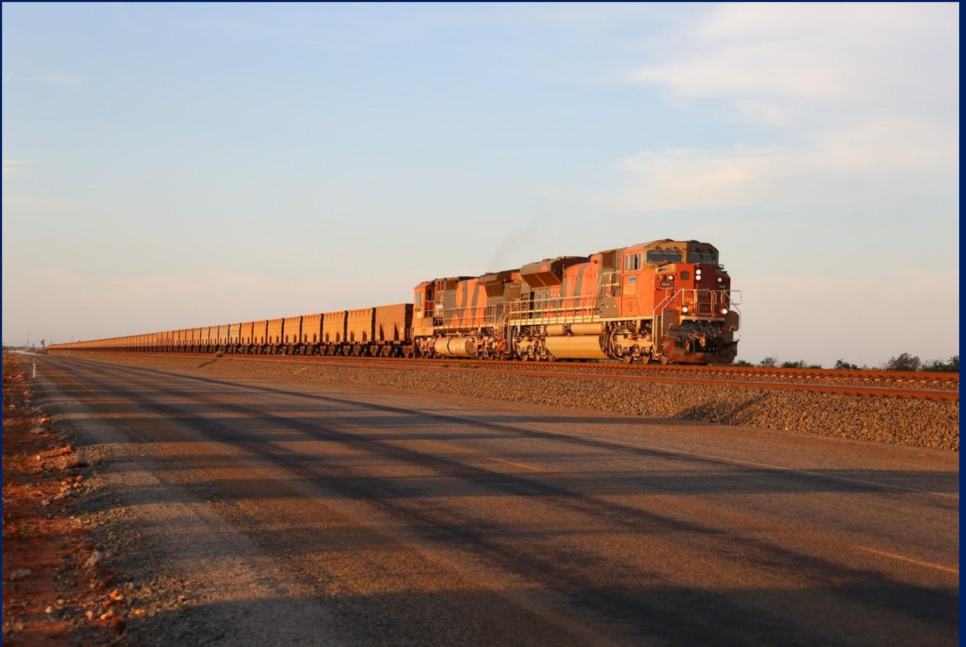
SD70ACe 4433 & CM40-8 5637 at head end of empty ore train south of Bing November 23rd.