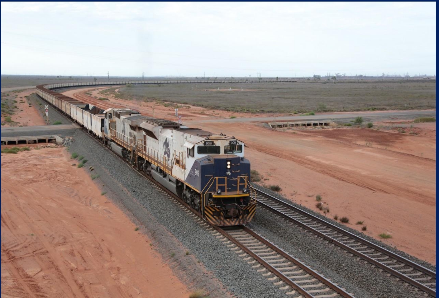
SD9043MAC 909 & 44-9CW 004 on empty at 5km curve with two compressor cars behind locos 22/11.