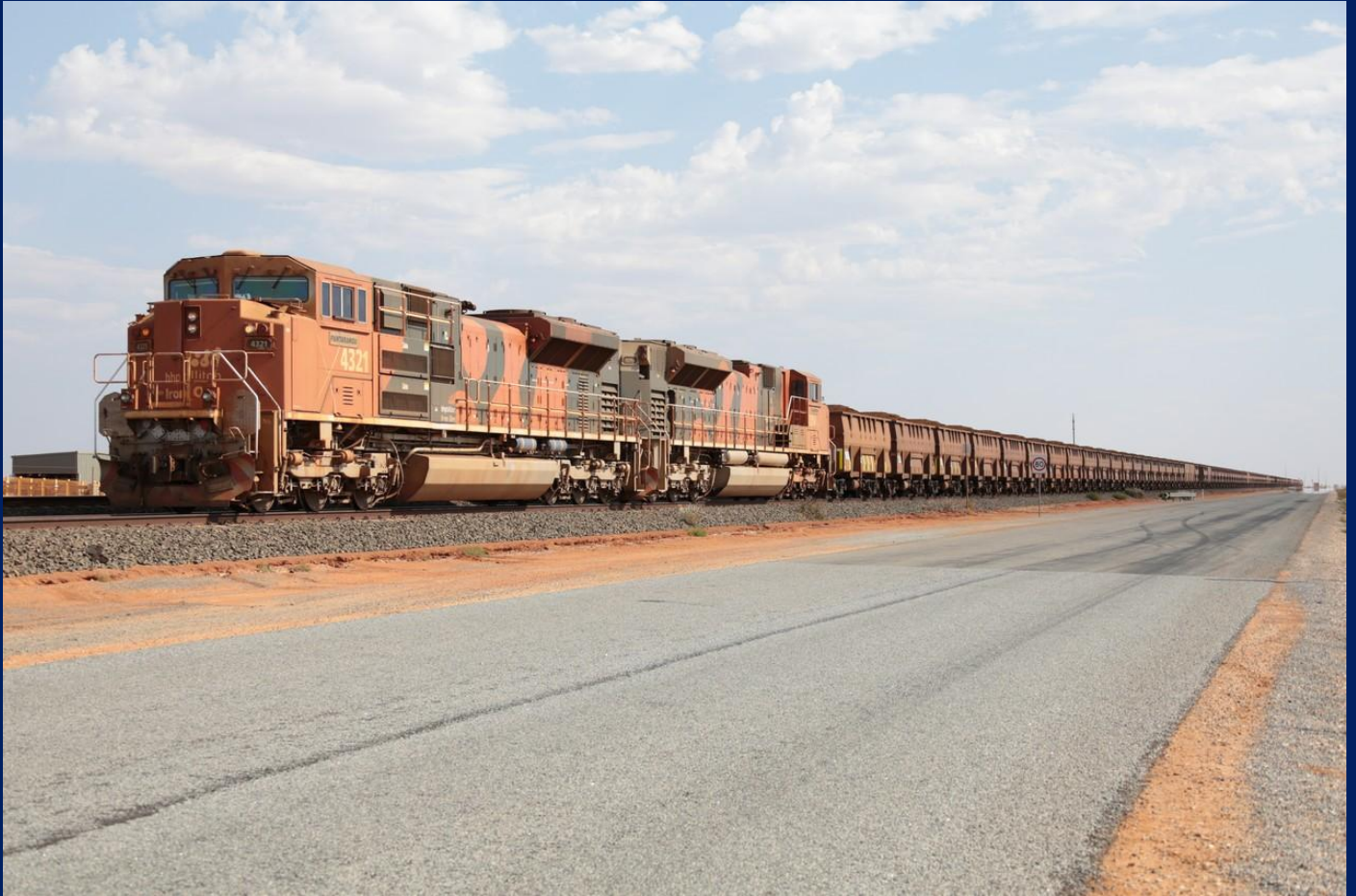
BHPBIO EMD SD70ACe 4321 & 4314 on loaded ore train holding West Mainline at Bing November 7th.