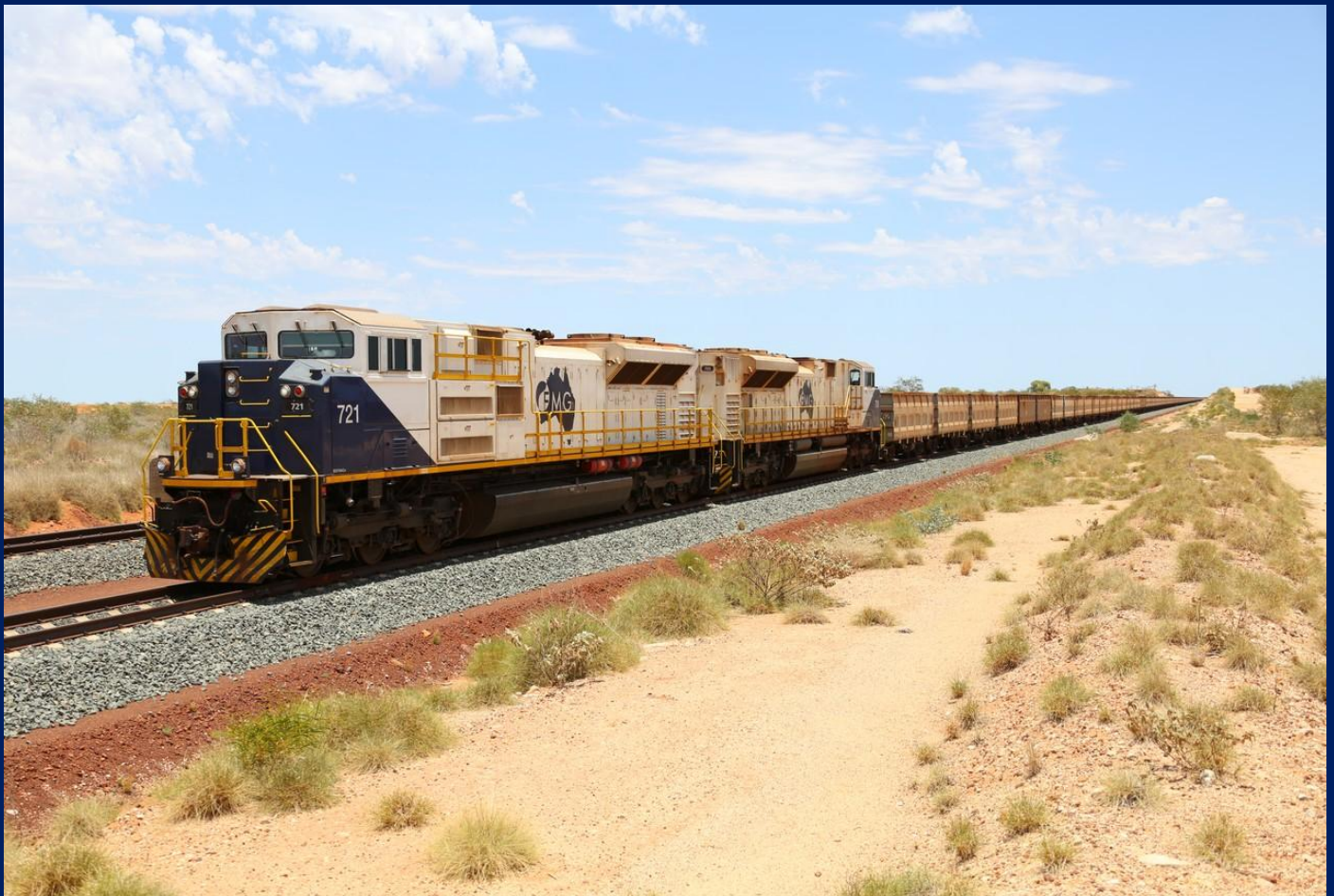
SD70ACe 721 & 709 on empty ore train at Chapman on November 23rd.