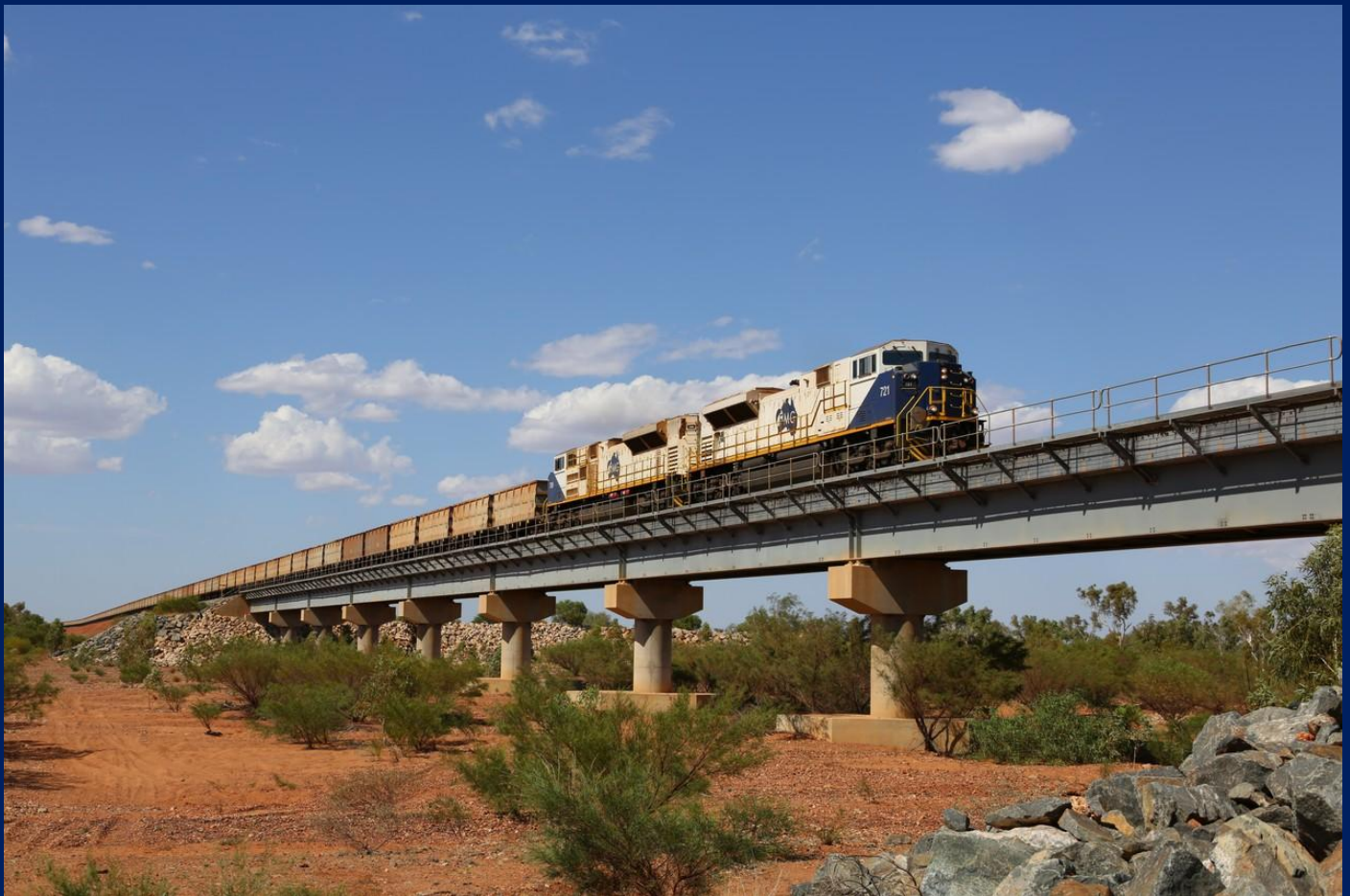
FMG SD70ACe 721 & 709 on empty ore train crossing Turner River Bridge November 23rd.

A further set of photos of railroad operations on the remote Pilbara mines trains in north west of this state centred on Port Hedland for BHP Billiton Iron Ore, Fortescue Ming Group and presently under construction Roy Hill Railroad with Rio Tinto at Dampier and Cape Lambert. These are 24/7 operations with empties running to the mines to be loaded and running to the port car dumpers where the ore is then loaded onto ships for export to customers in Asia and Europe. Most of the locomotives in use in this region are US built CW44-9W, ES44DCi or SD70ACe that were imported new. Some rebuilt second hand SD9043MAC from the US and remanufactured Australian built CM40-8M are still in service, with the -8s being steadily withdrawn as new SD70ACes arrive on BHPBIO.