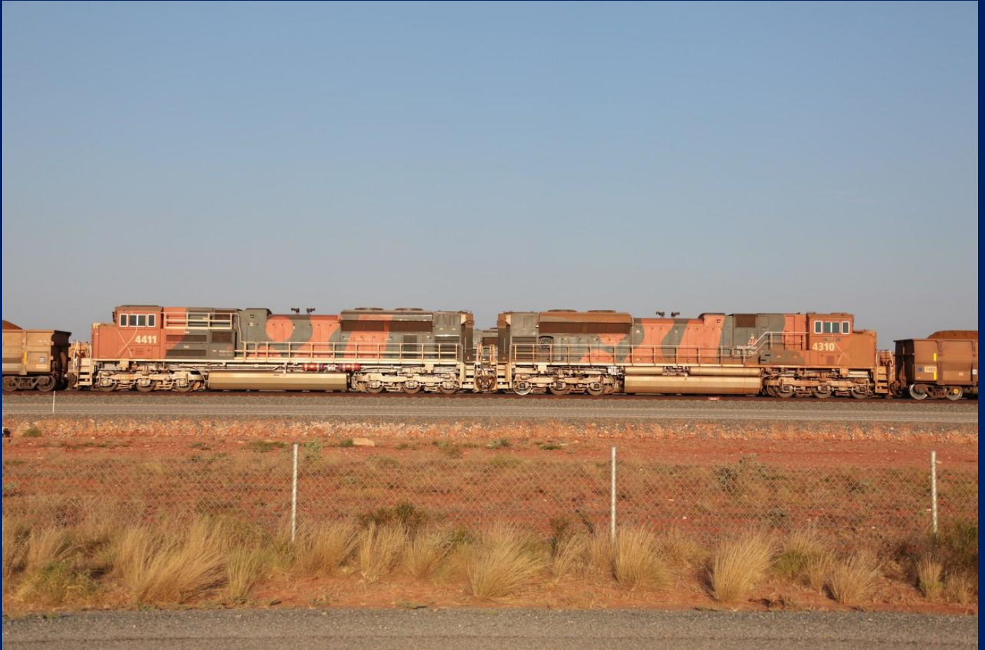
4411 & 4310 [now stored] remote units on loaded ore rake at Mooka Staging Facility November 7th.