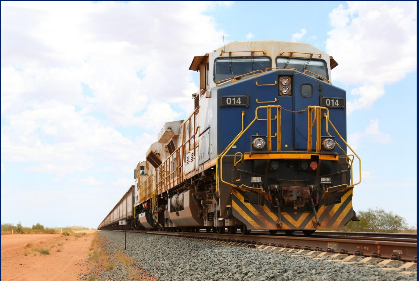
44-9CW 014 & SD70ACe 702 at 94km Durack with loaded ore train November 23rd.