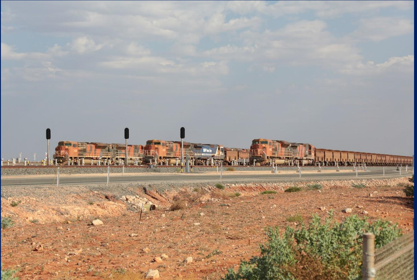
Mooka Staging Facility with loaded trains waiting admittance to Nelson Point unloaders 7/11.