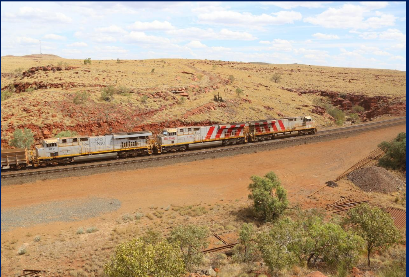
8180, 8198 & 8111 on empty ore climbing grade at Bensons Falls November 24th.