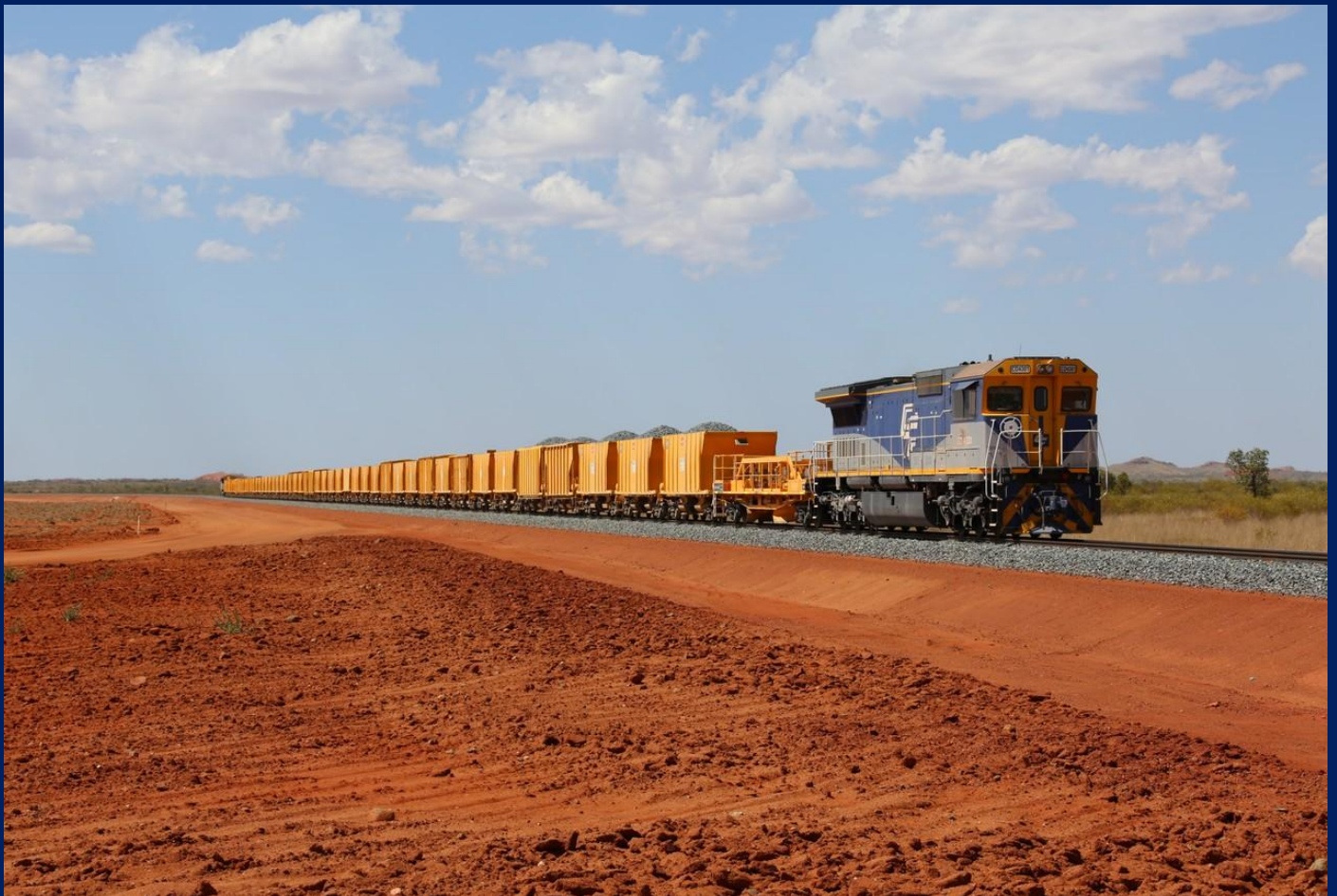
CFCLA CM40-8M CD4301 on rear Roy Hill ballast train at Wodgina Road crossing November 23rd.