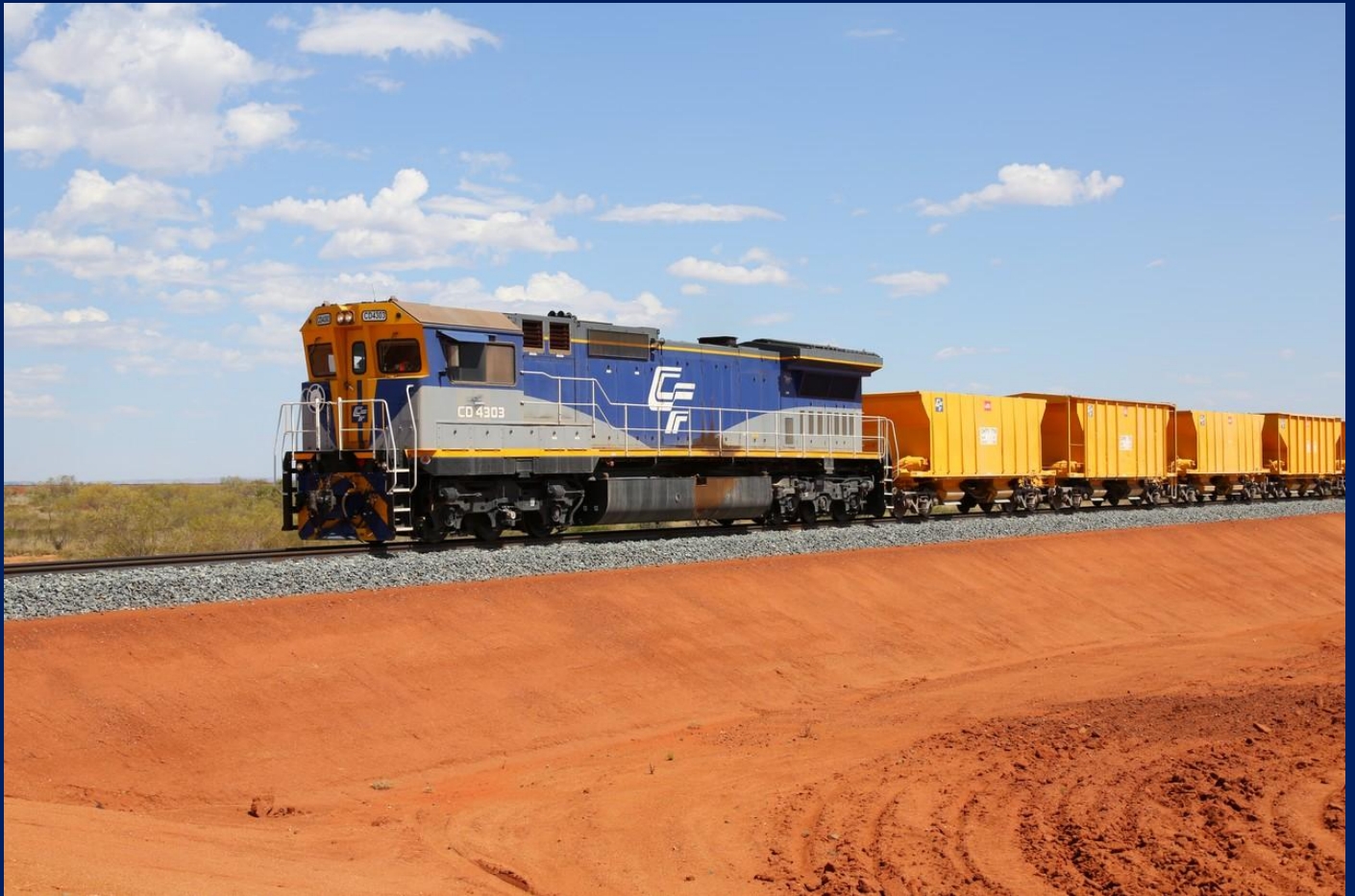
CFCLA CD4303 on lead with CD4301 on rear at Wodgina Road on way to 88km to ballast to 84 km 23/11.