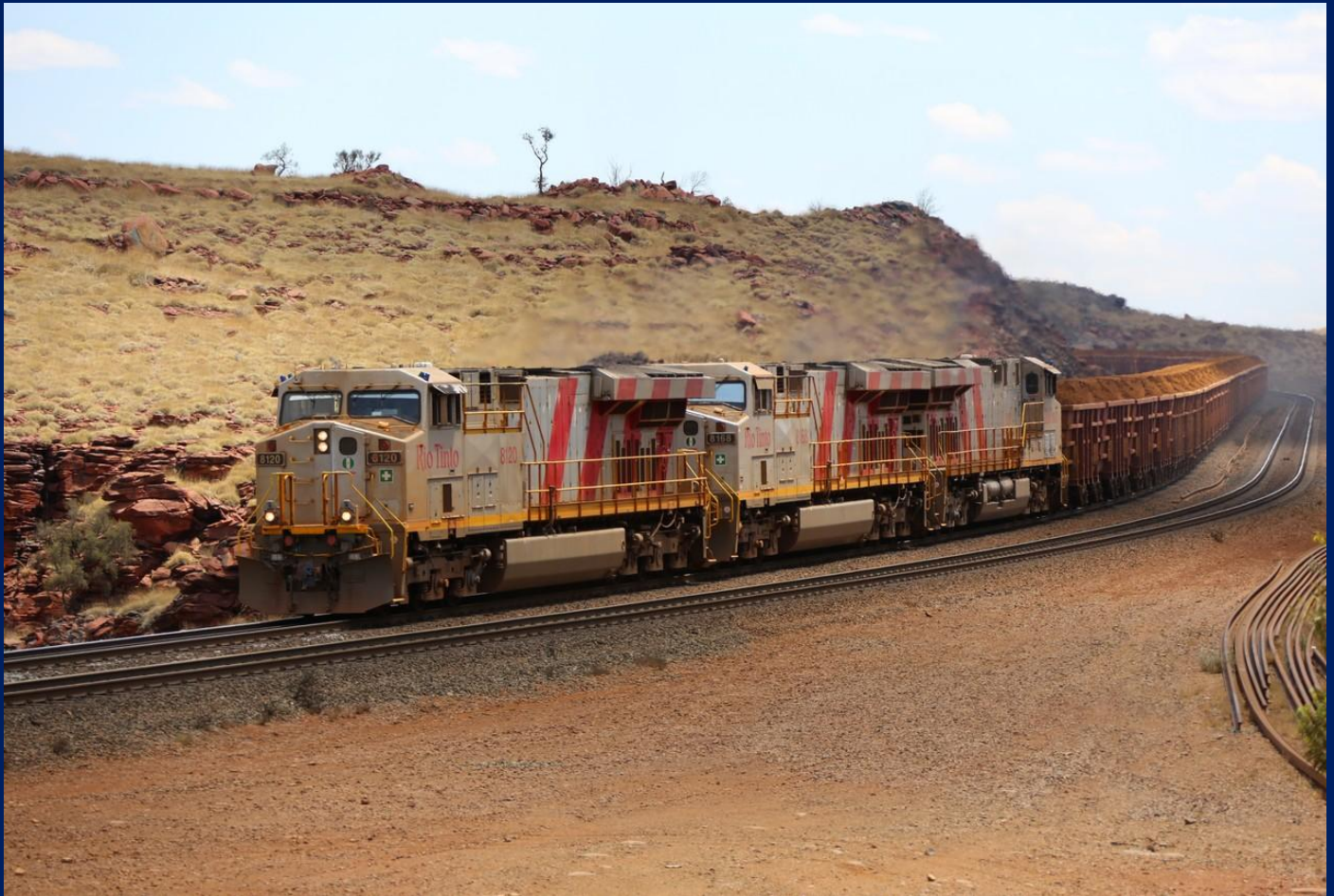
ES44DCi 8120, 8168 & 8179 on loaded in full dynamic descending the grade at Bensons Falls 24/11.