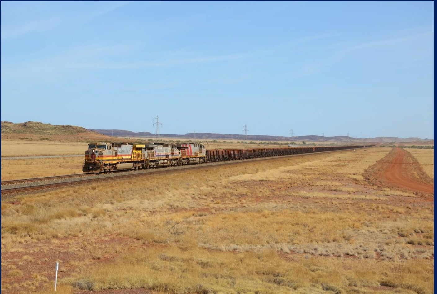
7056, 7083 & 8175 on empty "J Train" near Archers on way to Mesa J mine near Pannawonica 24/11.