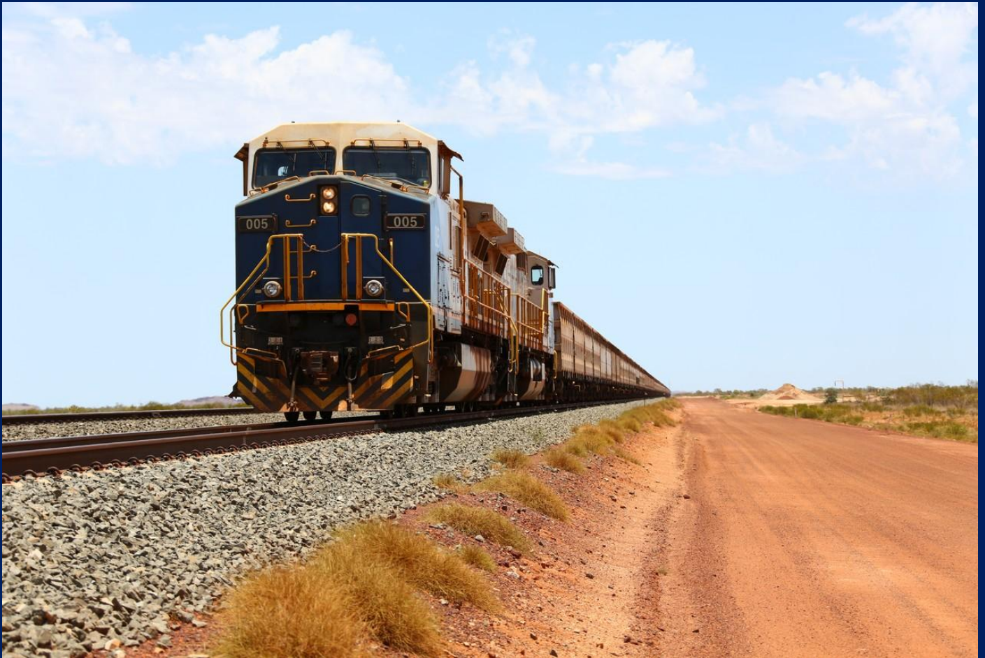
44-9CW 005 & 001 on an empty ore train at Canning on November 23rd.