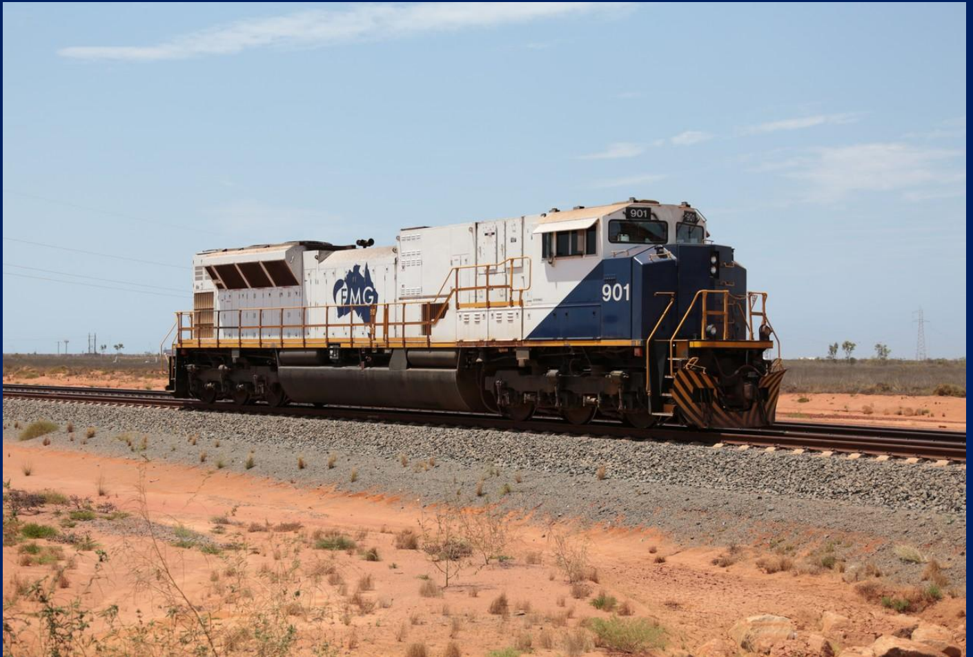
FMG 901 SD90MAC locally re-motored with 16-710 4300hp engine running light engine to port 7/11.