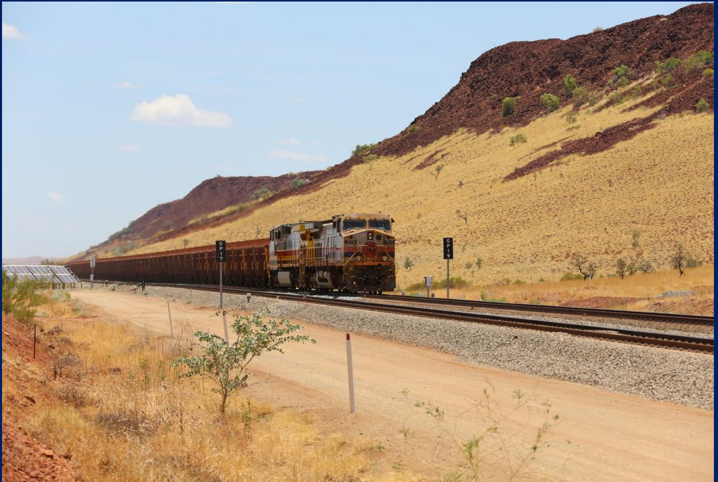
44-9CW 7070 & 7044 split signals at Greenpool on Cape Lambert line November 24th.