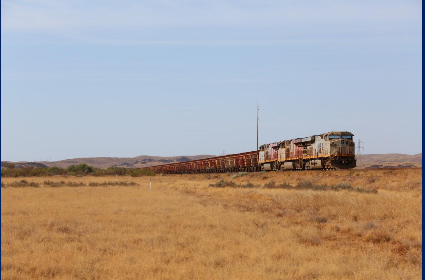
EVOS [ES44DCi] 8103, 8163 & 8167 on loaded sit at Archers waiting line clear to Cape Lambert 24/11.