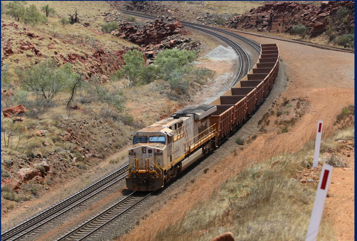
8116 on Autohaul train with six pairs of empty ore cars descending grade at Benson Falls on 24/11.