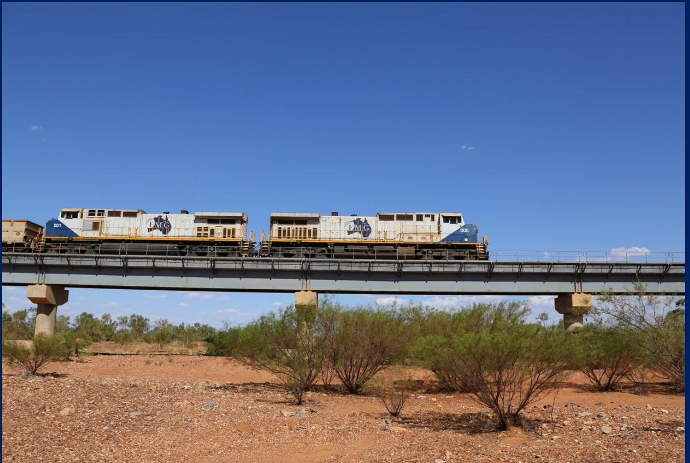
FMG General Electric 44-9CW 005 & 001 crossing Turner River Bridge with an empty ore train on 23/11.