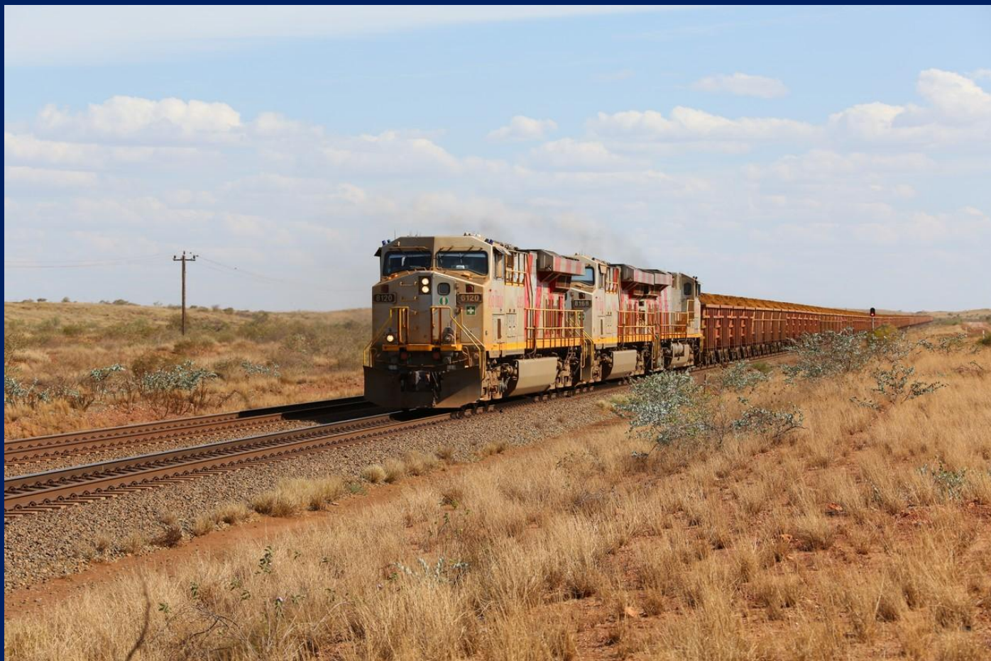
8120, 8168 & 8179 on loaded ore at North West Coastal grade crossing Dampier November 24th.