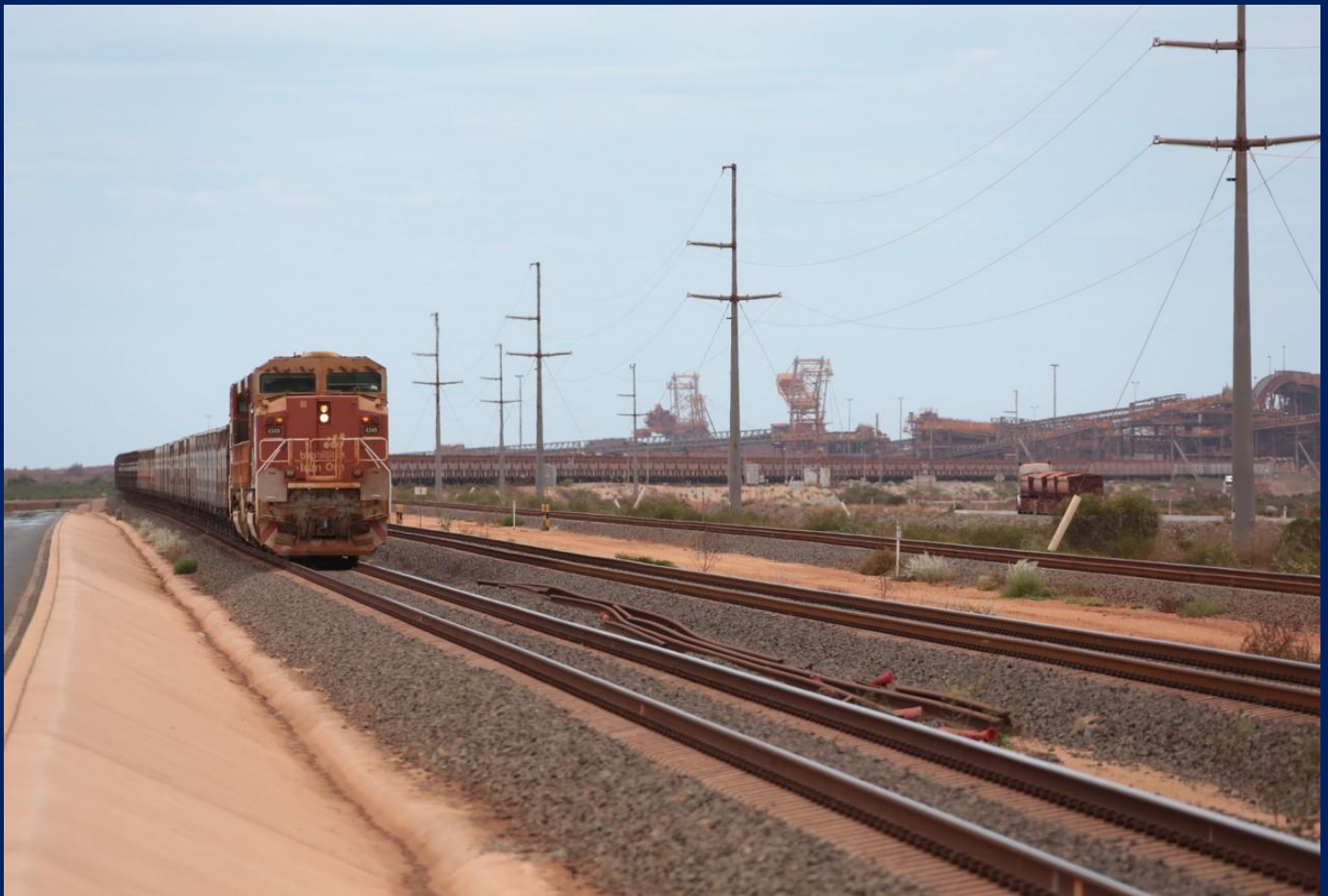
SD70ACe 4349 & 4344 on empty ore train at 1km Fimucane Island November 22nd.