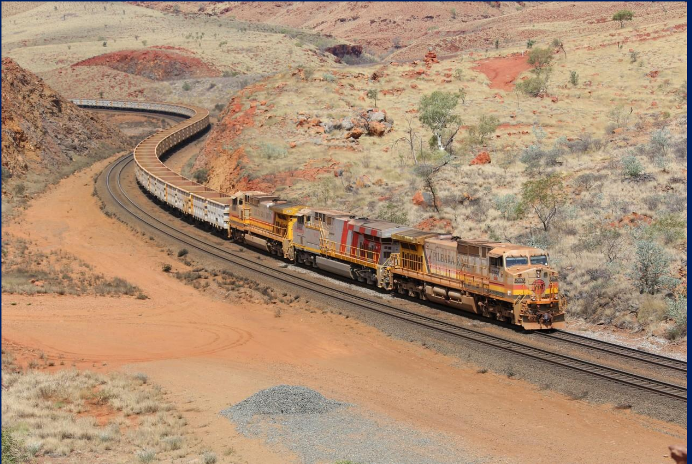
7097 "Ken Onley", 9102 & 7076 on empty climbing up Cichester Range at Bensons Falls 24/11.