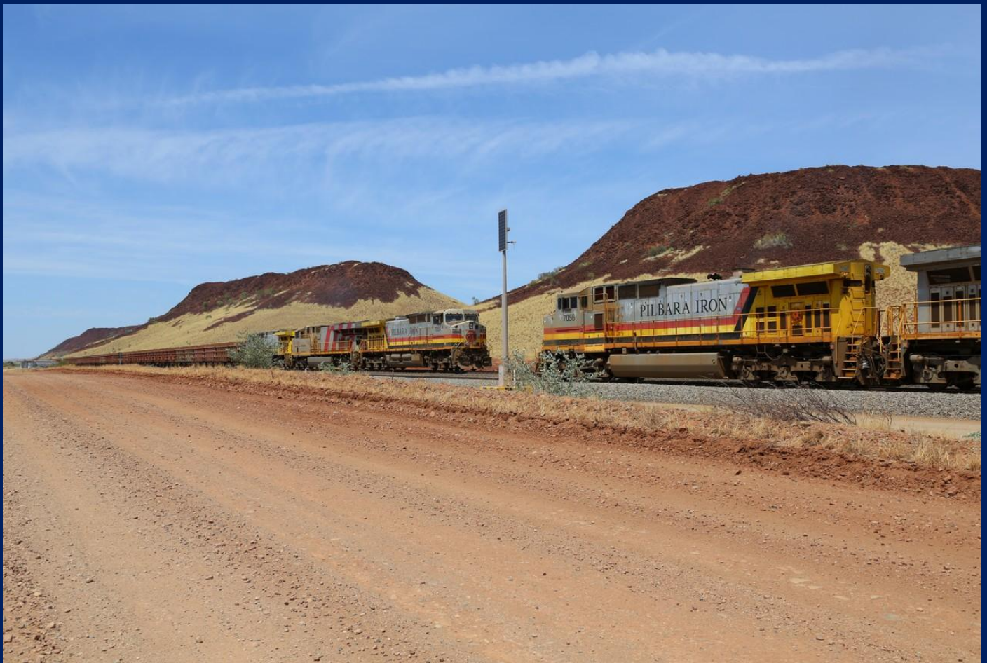
7056 on empty J train at Greenpool crosses 7055 leading loaded ore to Cape Lambert November 24th.