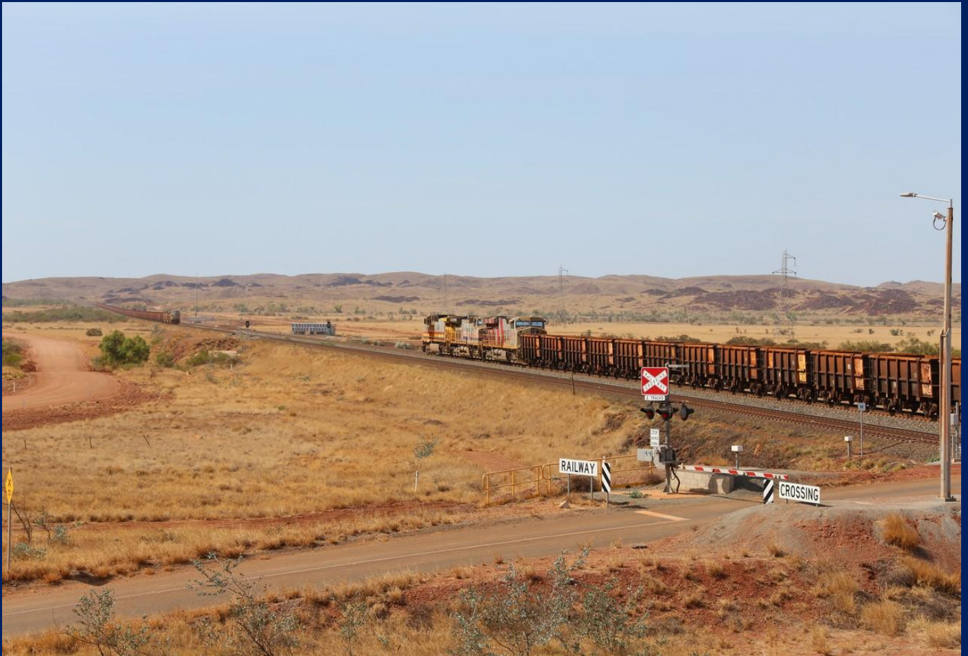
Empty to Pannawonica ore about to cross loaded ore at Archers November 24th