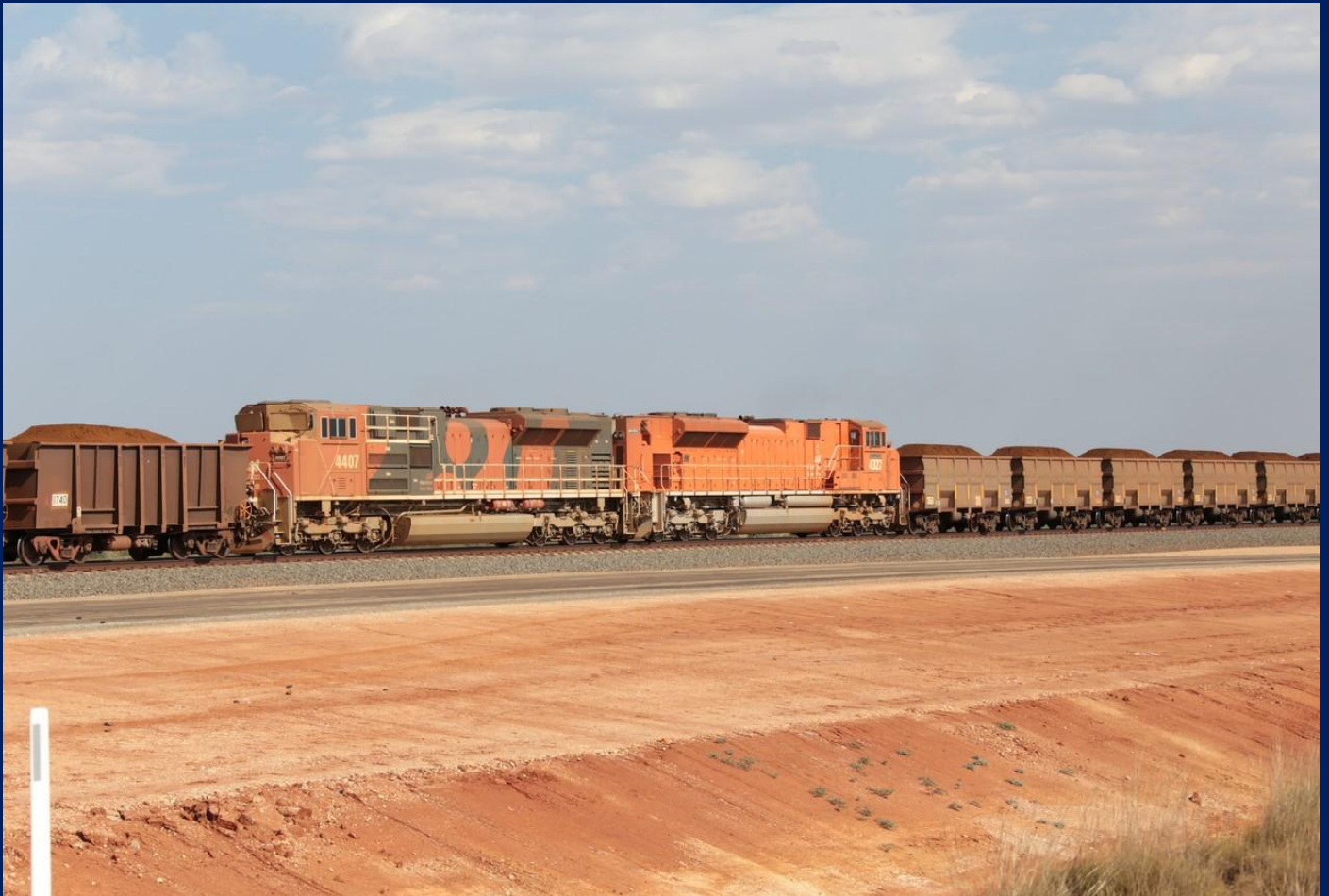
4407 & 4327 mid train helpers on loaded at Mooka Staging Facility waiting to run to Nelson Point 7/11.