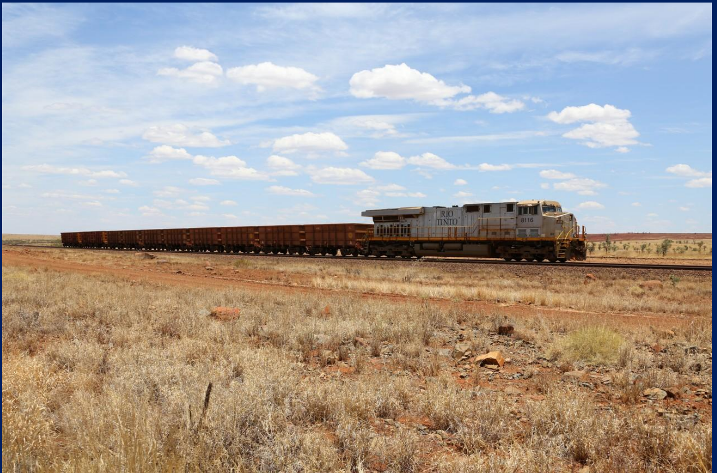
8116 with six pairs of empty ore cars testing automatic operation near Gecko November 24th.