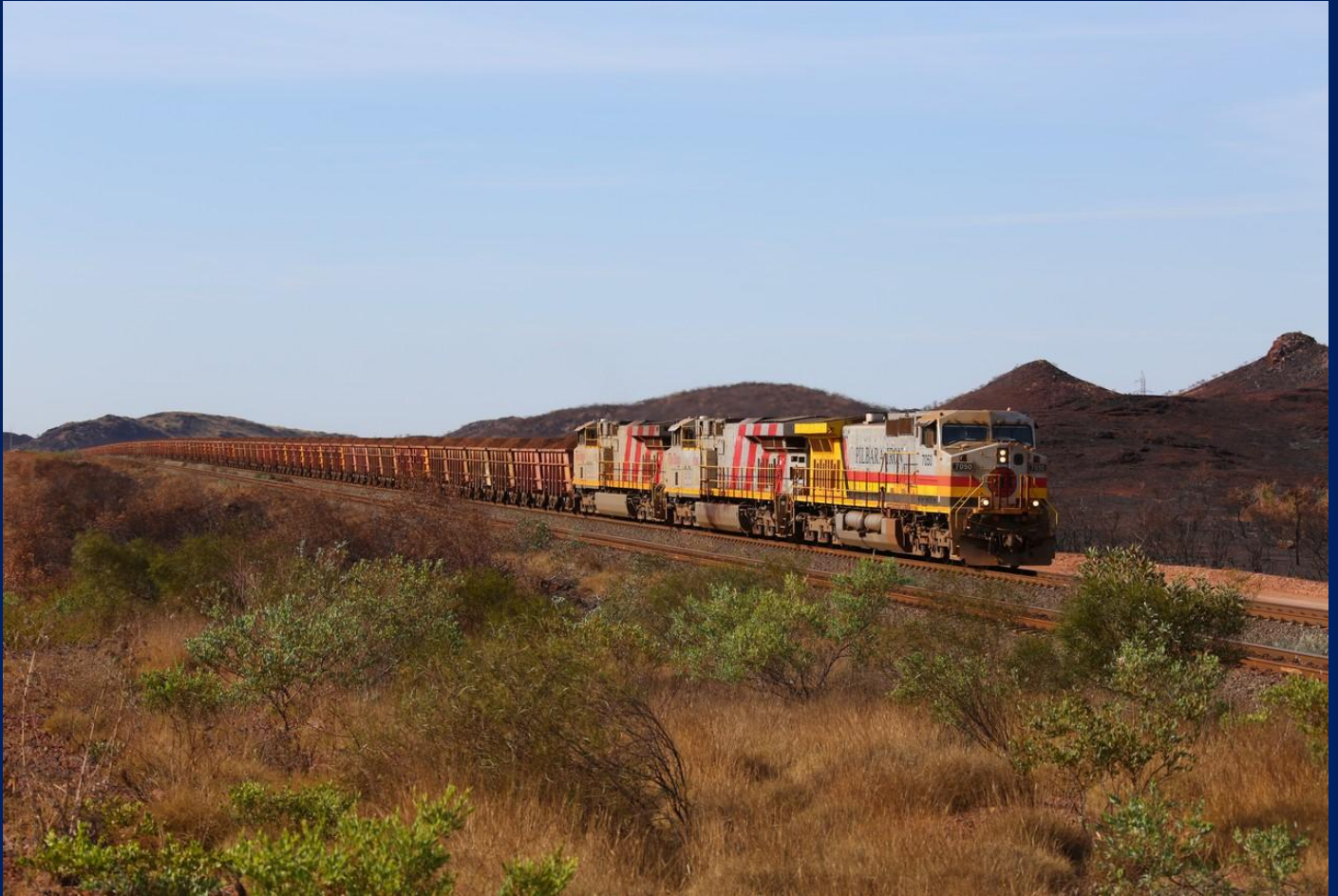
7050, 8126 & 8173 on loaded ore train at 14km peg on Robe River Cape Lambert line November 24th.