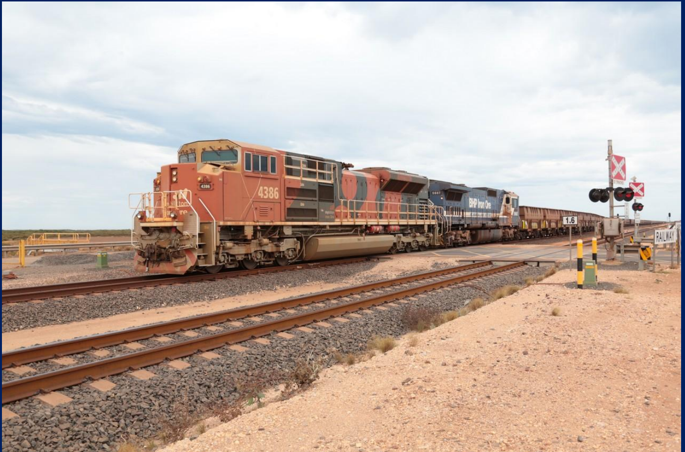
SD70ACe 4386 & CM40-8 5667 on empty ore at 1.6km crossing Finucane Island on way to Boodarie 22/11.