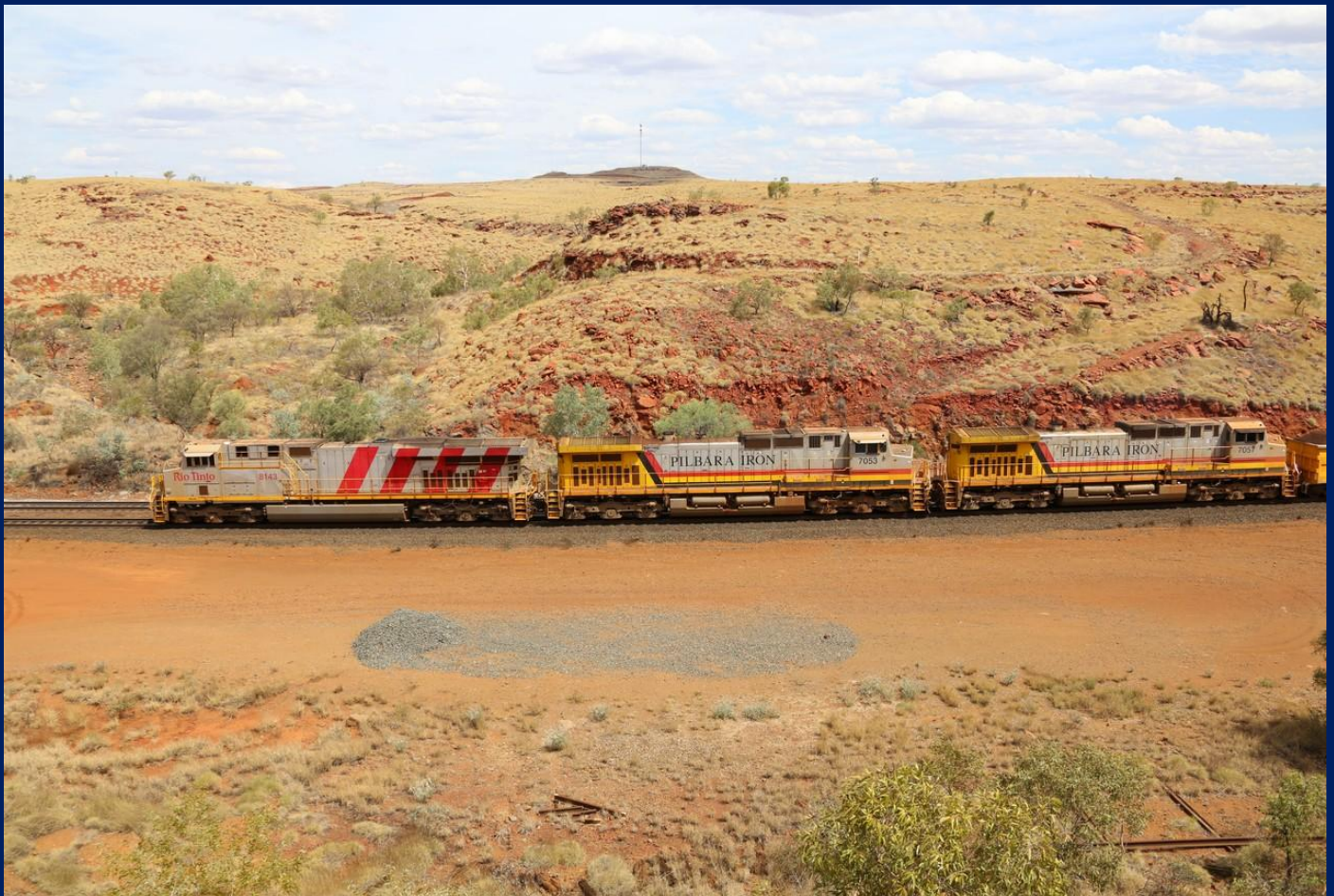
8143, 7053 & 7057 on loaded descending grade at Bensons Falls November 24th.