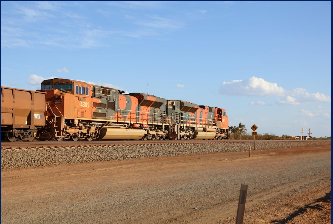
Original SD70ACe 4309 trailing 4392 on empty ore train just north of Mooka November 23rd.