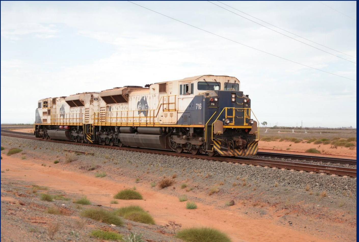
SD70ACe 716 & 706 running light engine from port to Kanyirri Yard to refuel November 22nd.