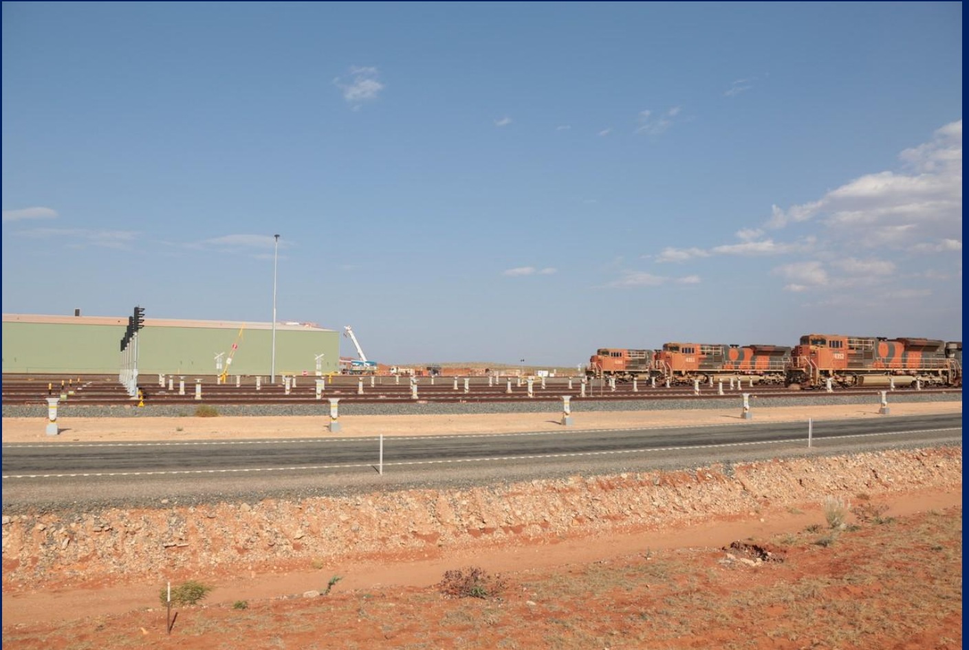
Mooka Staging Facility with new ore car repair shop under construction November 7th.