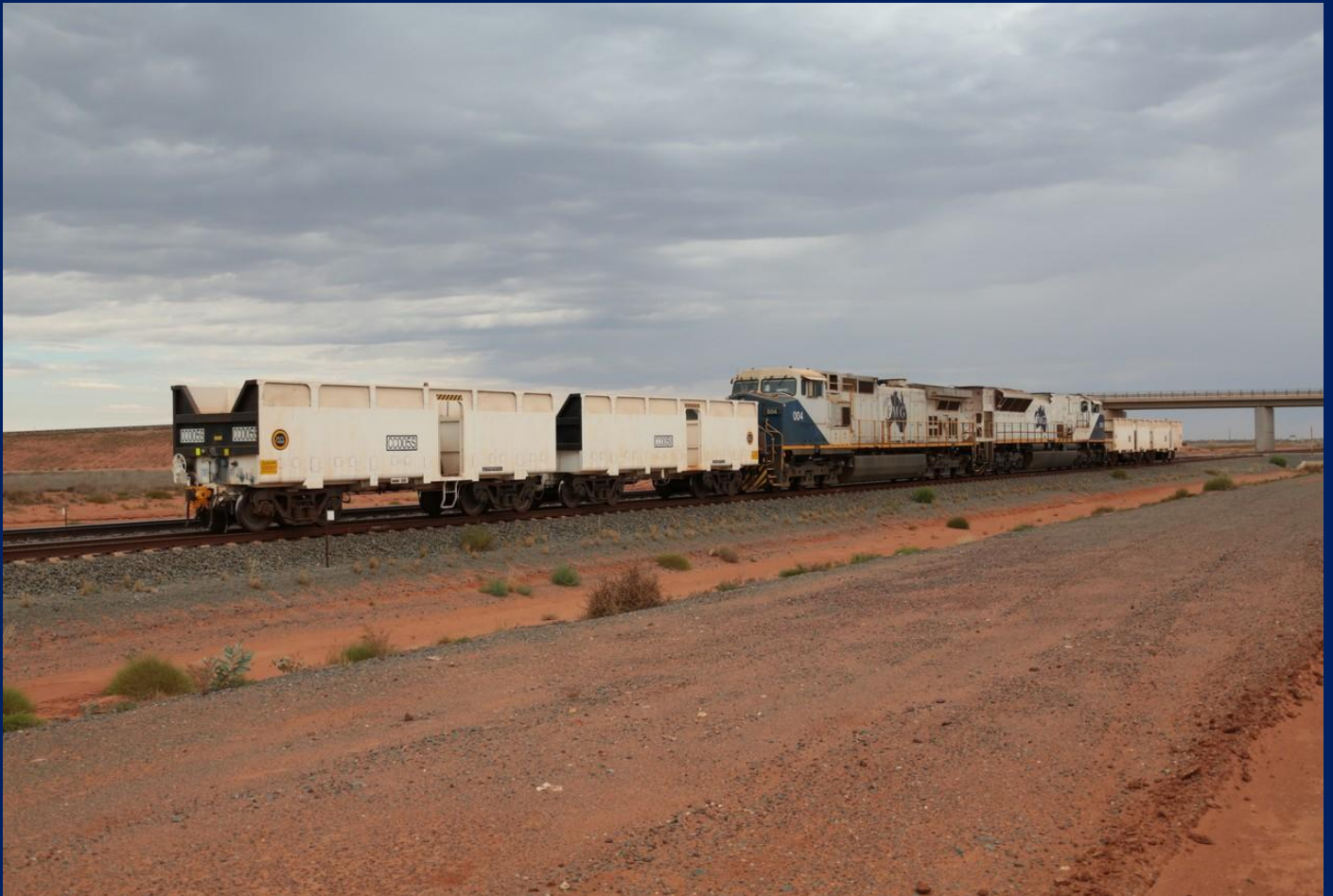
44-9CW 009 & SD9043MAC 909 shunt compressor car CC005 front and CC002 on rear back to port 22/11