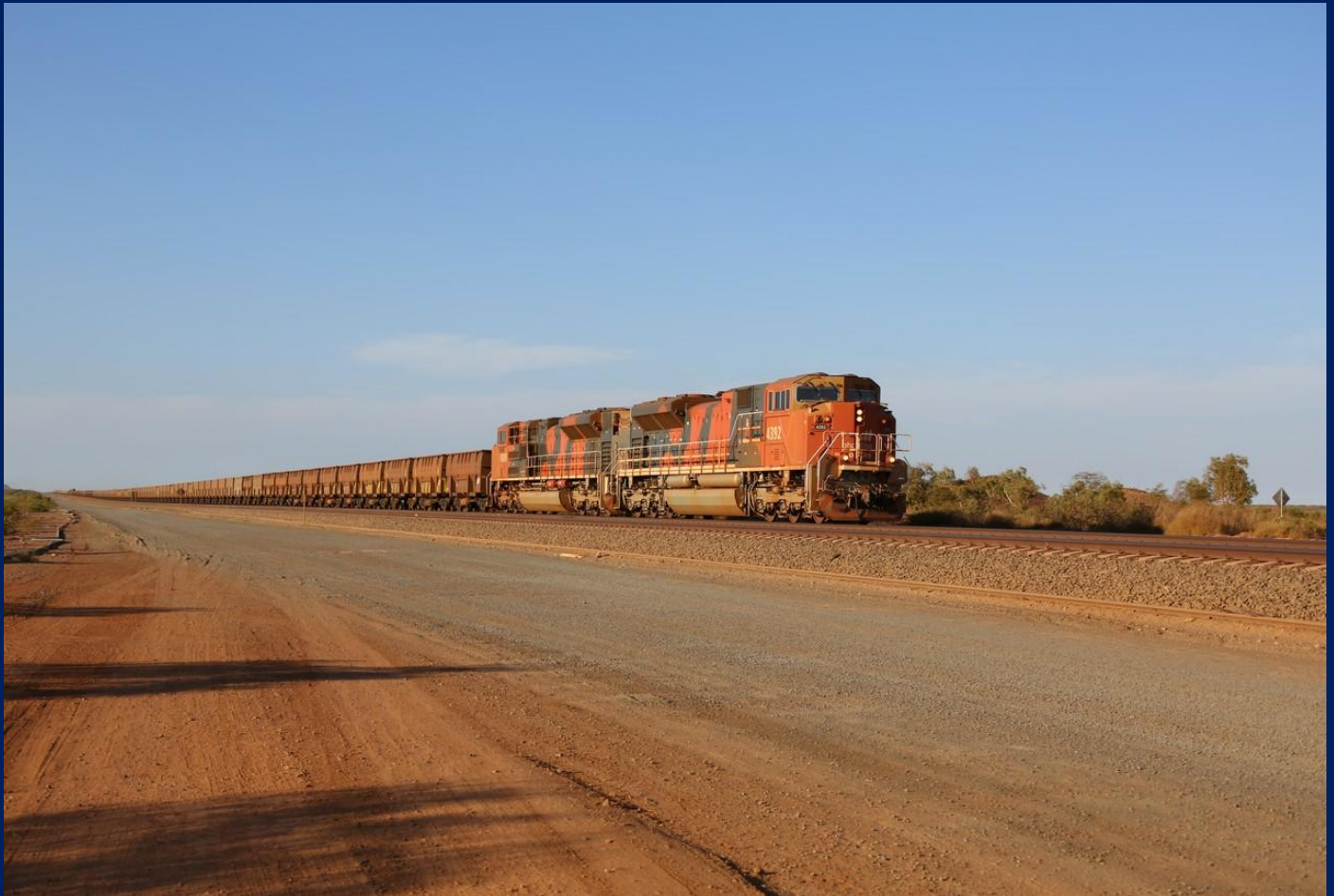
BHPBio SD70ACe 4392 & 4309 [only one of two original units remaining in service] on empty Mooka 23/11.