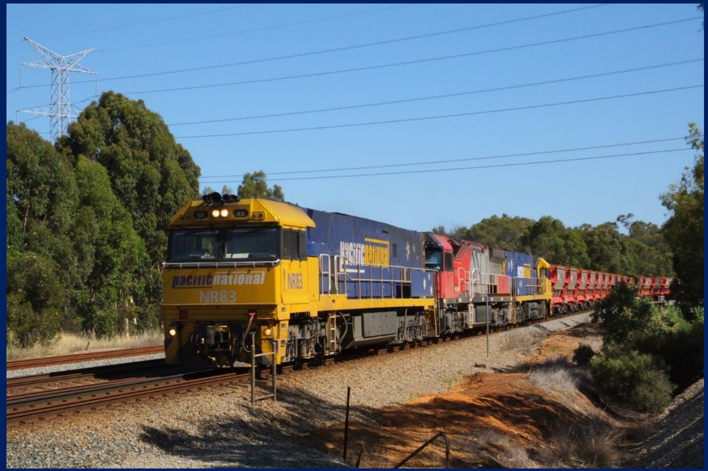
NR83, MRL003 & failed NR111 on late 5032 Polaris ore at Woodbridge December 19th.