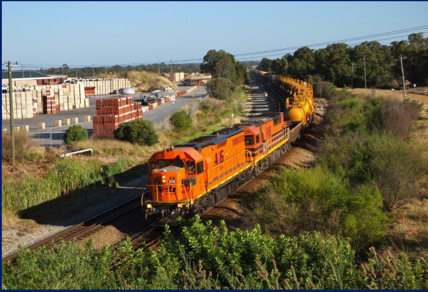
LZ3114 leads Q4004 on 4426 freight ex Kalgoorlie at South Guildford December 18th.