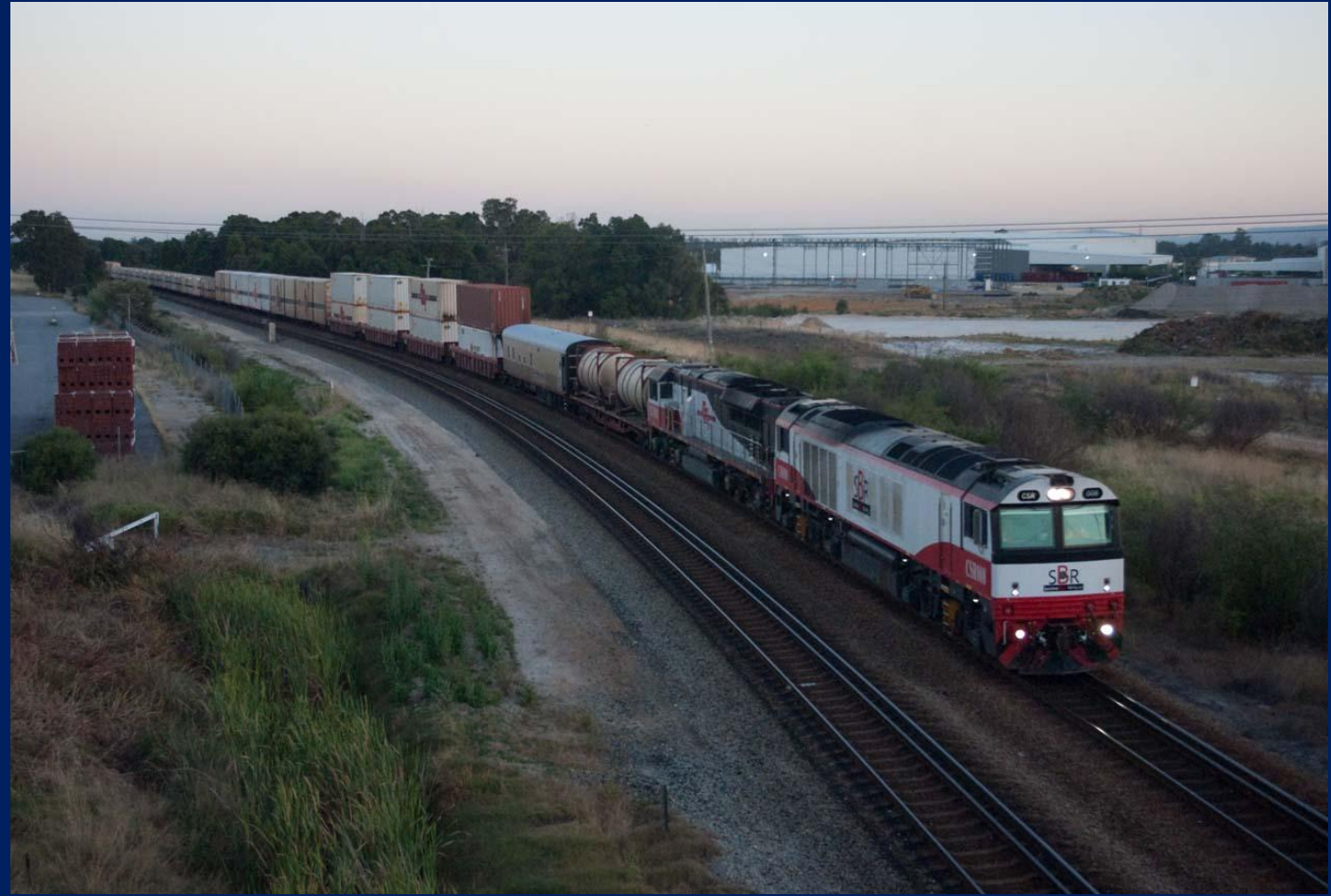
CSR008 & SCT003 on 3MP9 SCT freighter South Guildford at sunup December 12th.