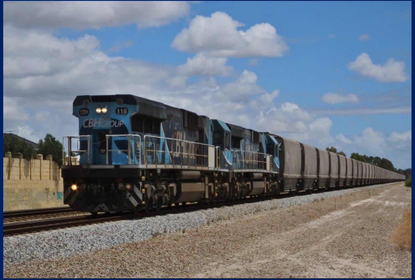
CBH118 & CBH120 on 2S57 empty Watco grain at Thornlie December 15th.