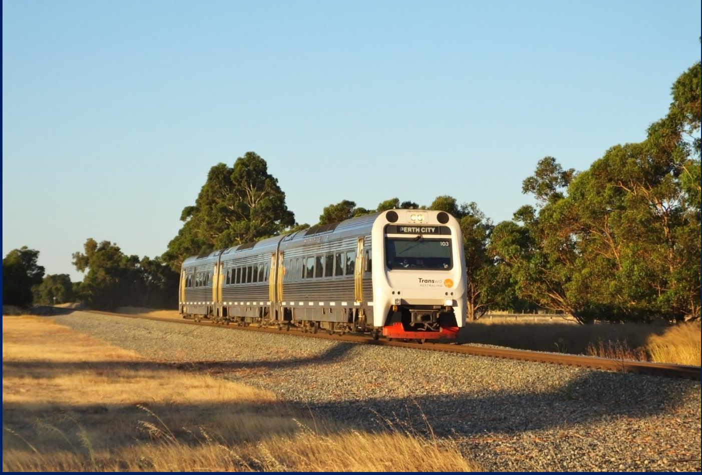
Evening 4215 Australind service from Perth to Bunbury at Keysbrook December 31st. Pho