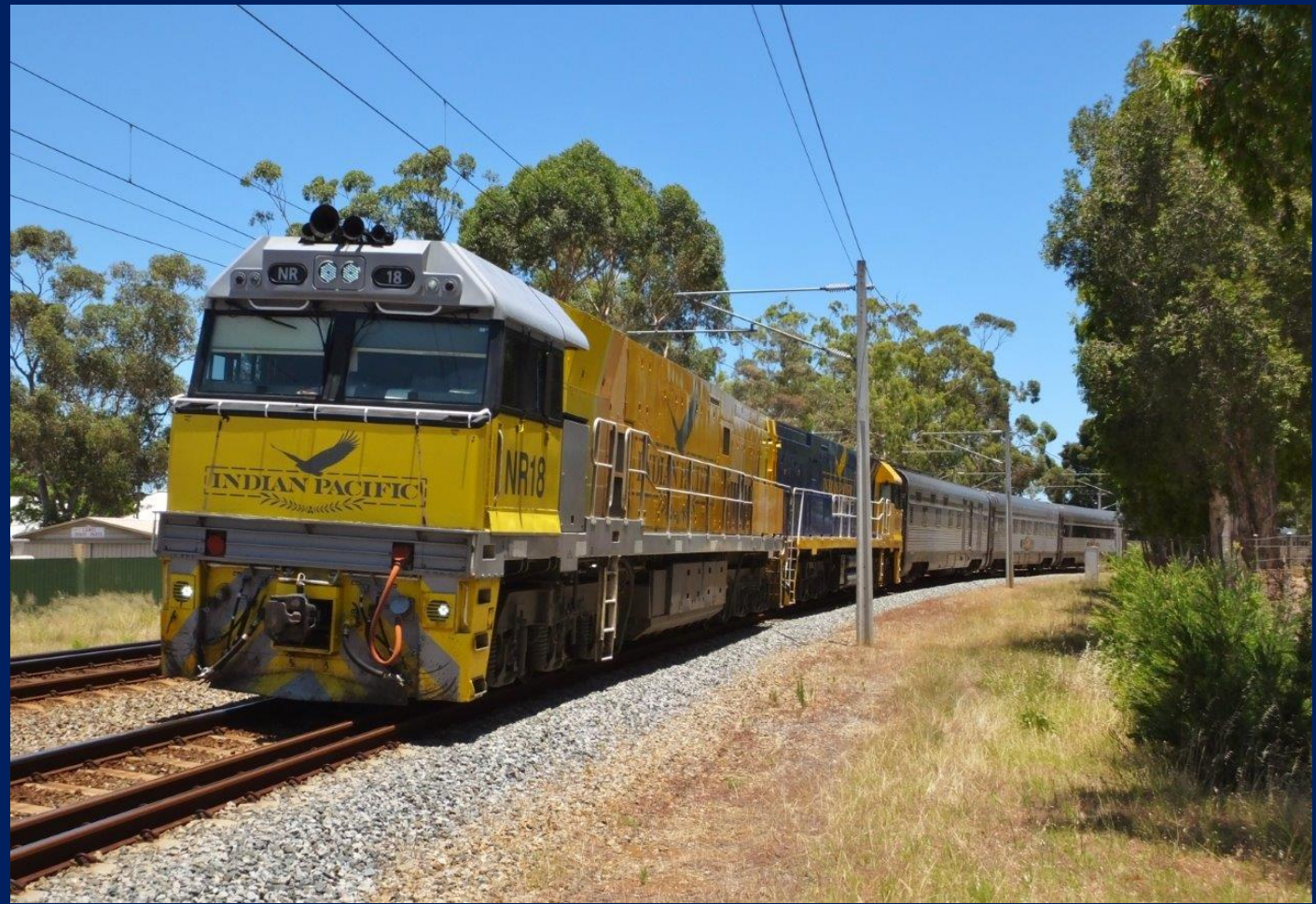
NR18 & NR27 on 1PA8 Indian Pacific under the wires at East Guildford December 28th.