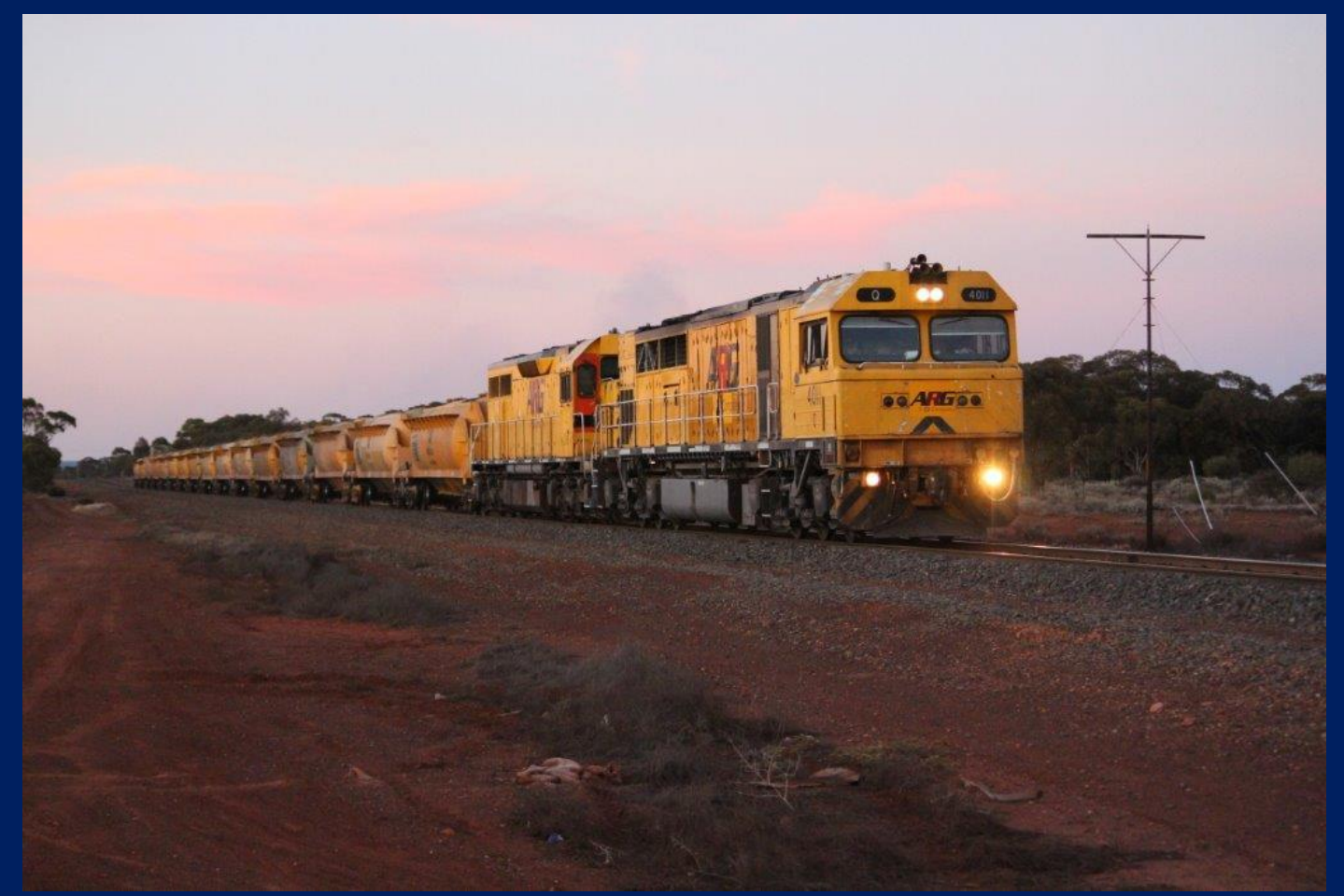
Q4011 & L3115 on 7478 nickel from Leonora at 4km Kalgoorlie December 27th.