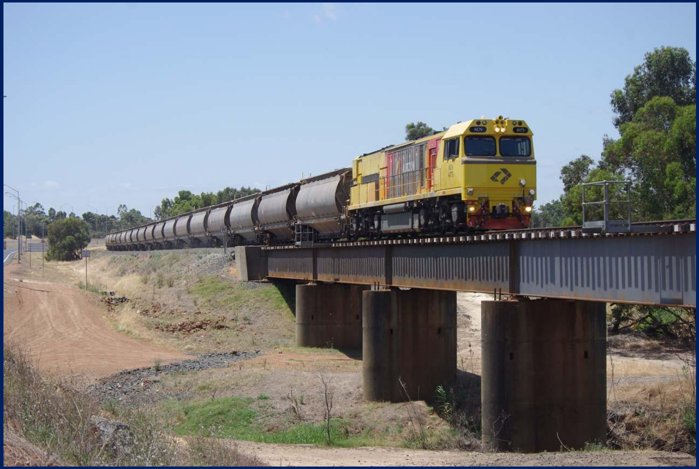
ACN4173 on loaded alumina hoppers crosses Collie River at Burekup December 20th.