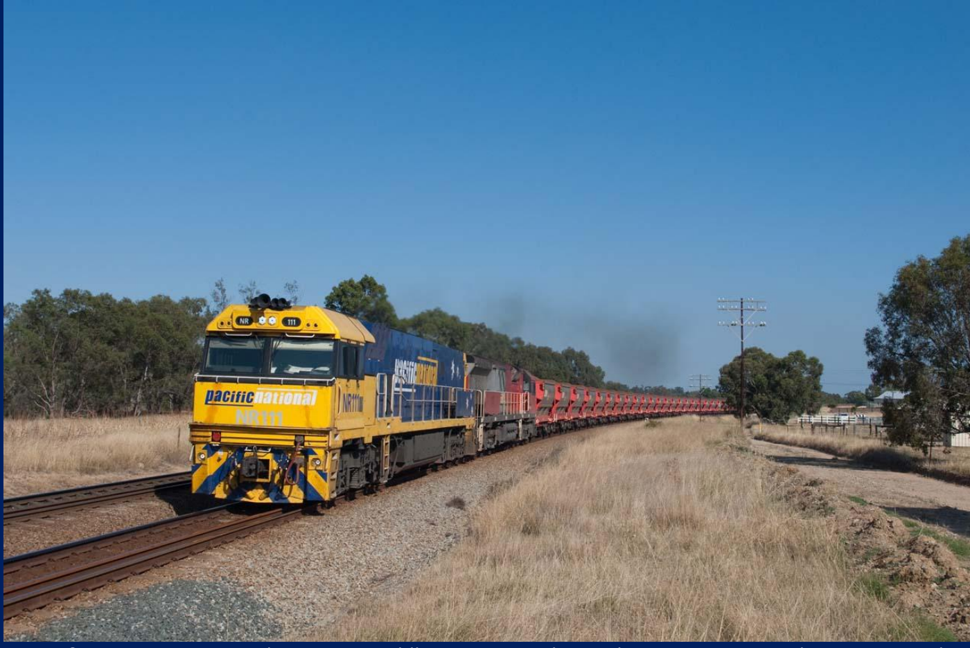
NR111 & MRL003 on 3030 Polaris ore at Middle Swan December 17th.