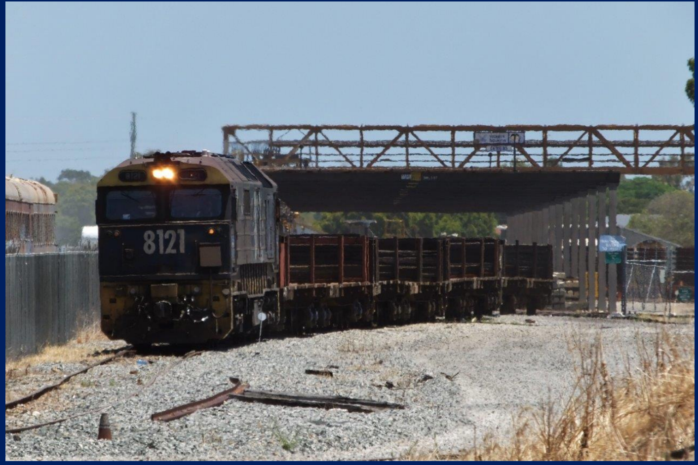
8121 shunting empty rail wagons out of Midland flashbutt yard December 19th.