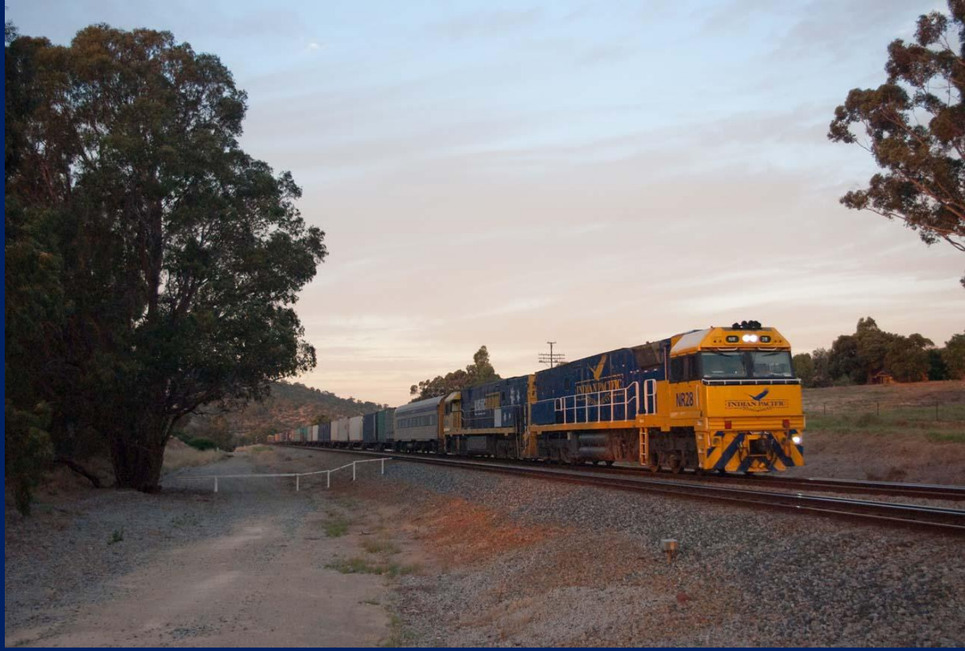
NR28 & NR30 on 7SP3 intermodal leaving Avon Valley at Brigadoon December 8th.