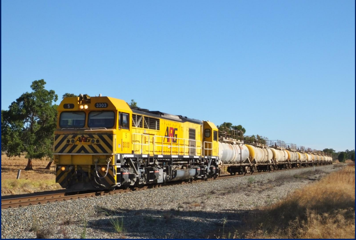
S33003 on 4238 empty caustic tankers from Calcine to Kwinana at Keysbrook 31/12.