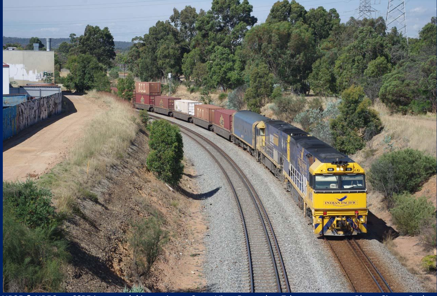
NR25 & NR56 on 6SP5 intermodal in cutting at Swan View December 7th.