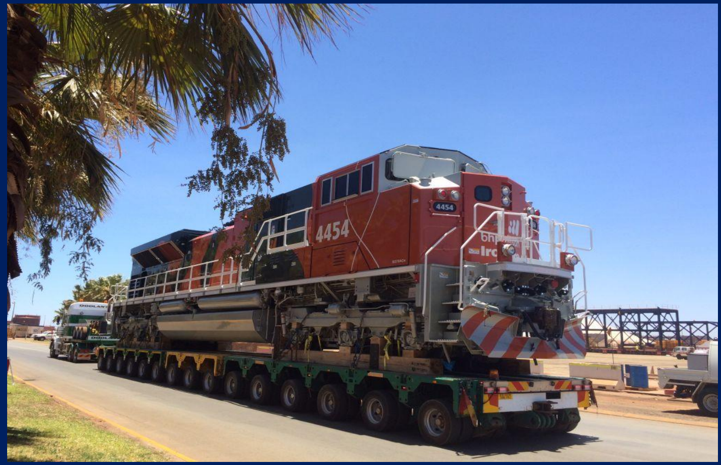
BHPBIO SD70ACe 4454 being hauled to Nelson Point for commissioning 8/12.