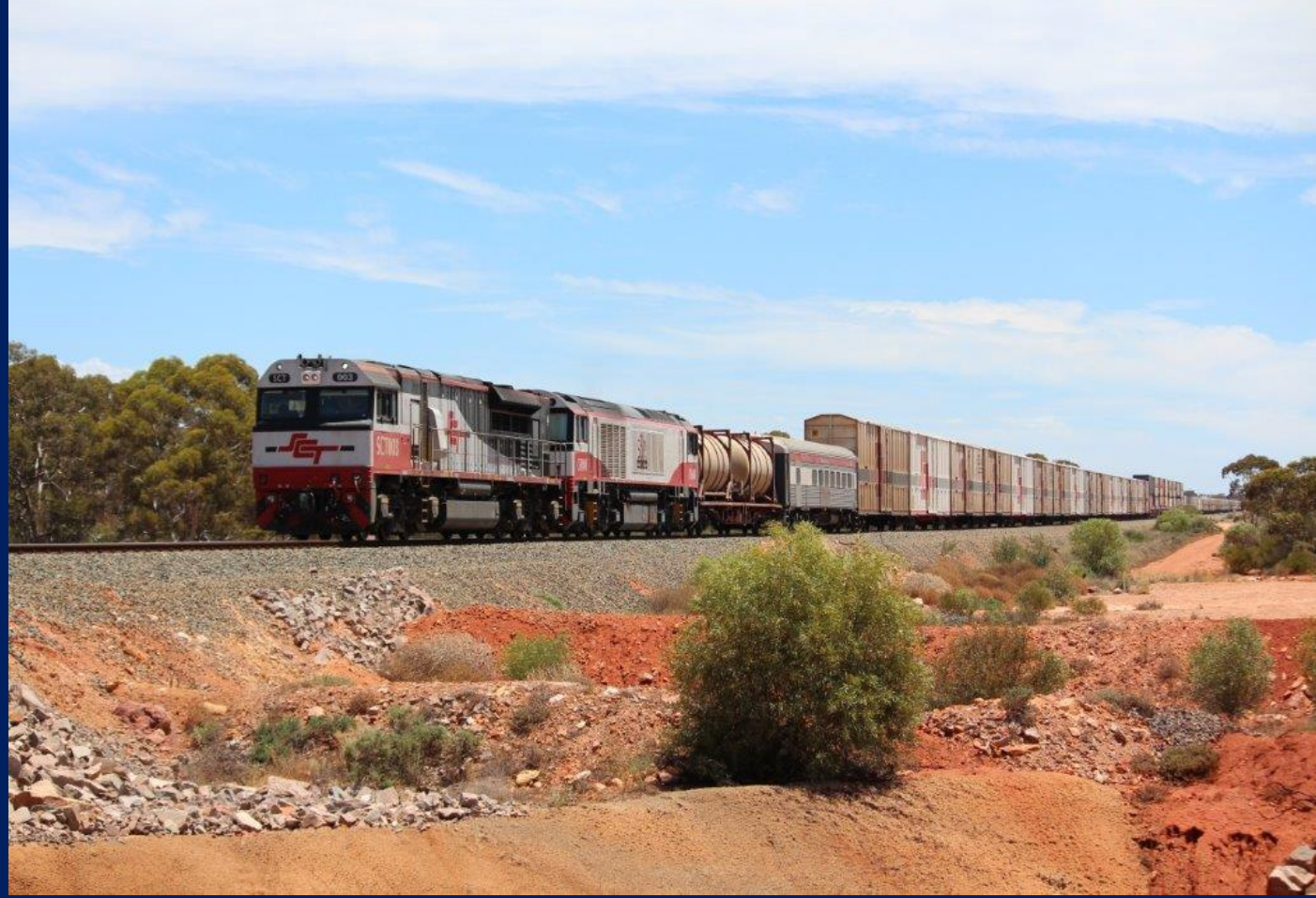
SCT003 & CSR008 on 1PA9 SCT special Perth Adelaide extra at Binduli 16/12.