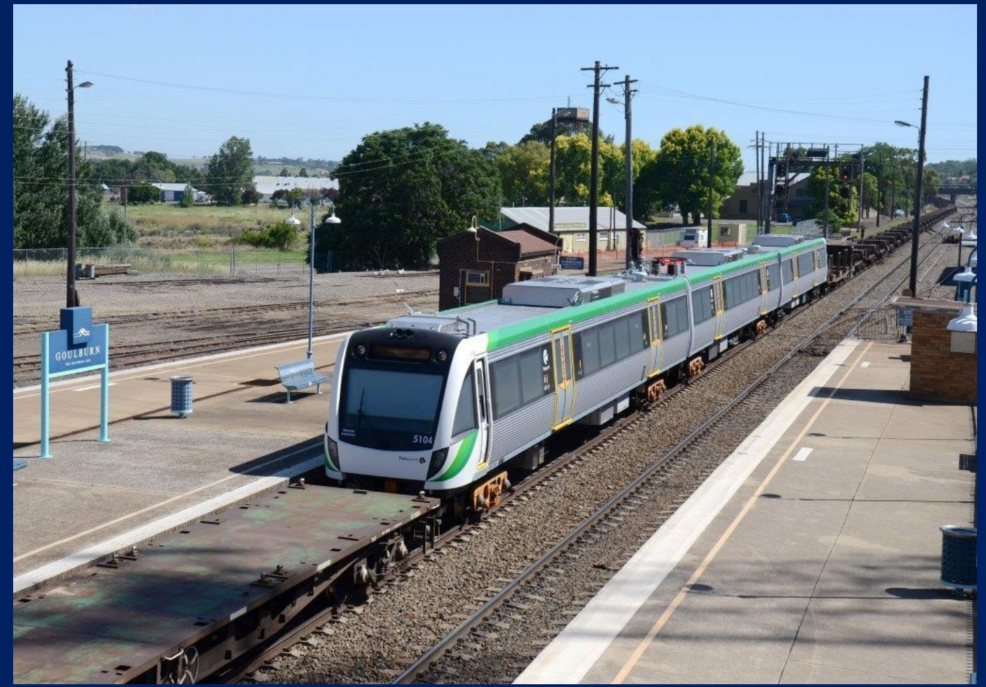
New Transperth/PTA B series EMU 5104 on rear 4NY3 steel at Goulburn NSW 17/12.