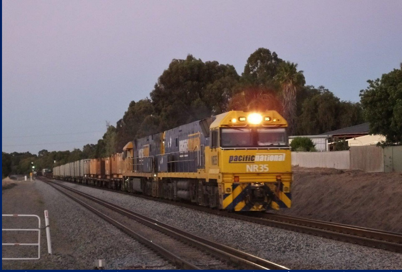
NR35 & NR6 on 5MP2 steel with new EMU set #104 on rear at Hazelmere 21/12.