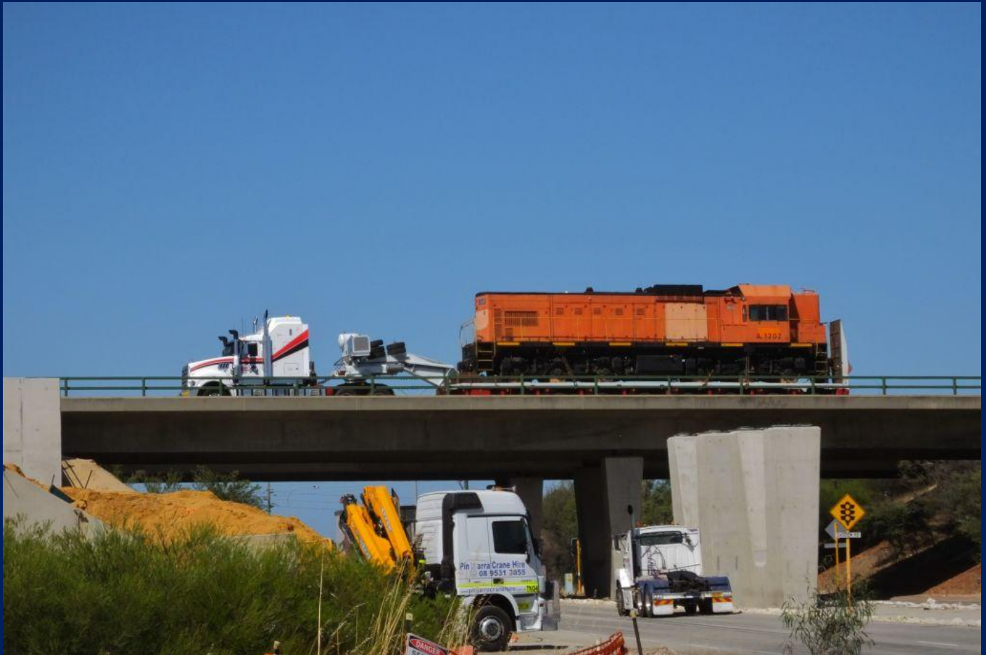
A1202 final locomotive to leave Forrestfield for export crossing Tonkin Highway bridge January 8th.