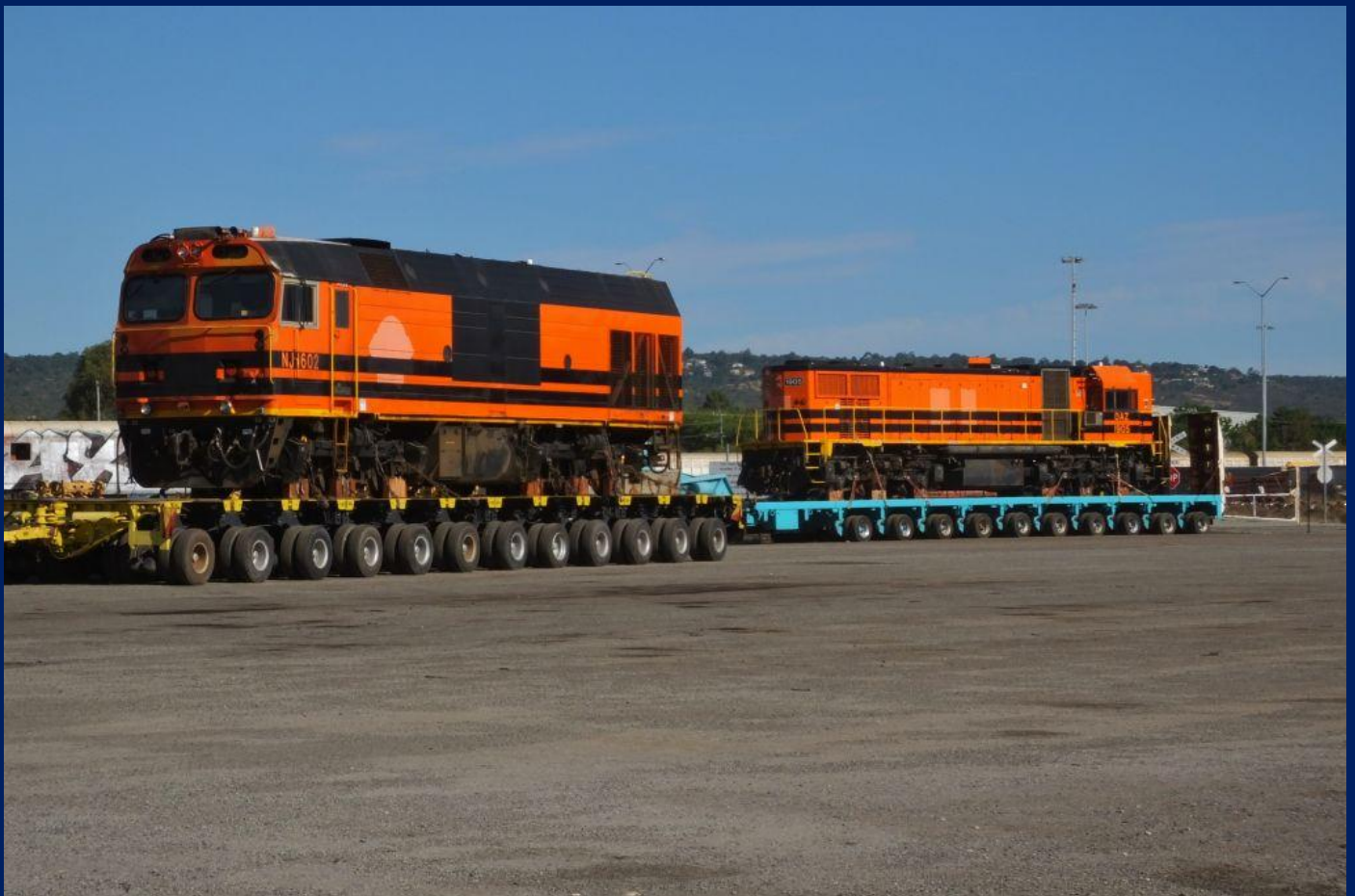
NJ1602 & DAZ1905 on transport floats parked at Forrestfield on January 7th.