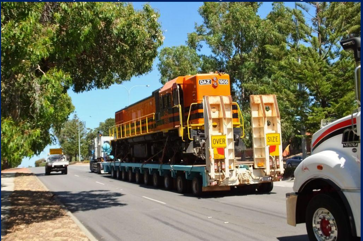
DAZ1905 nearing top of grade on Leach Highway Palmyra on January 8th.