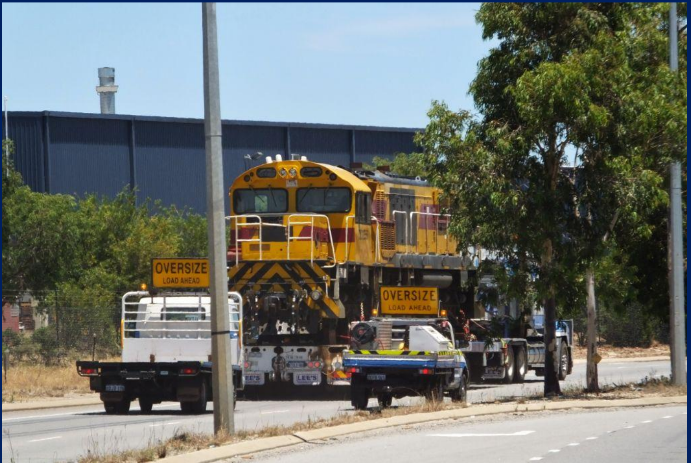
DD2356 departing Forrestfield en-route to Fremantle port for export on January on 7th.