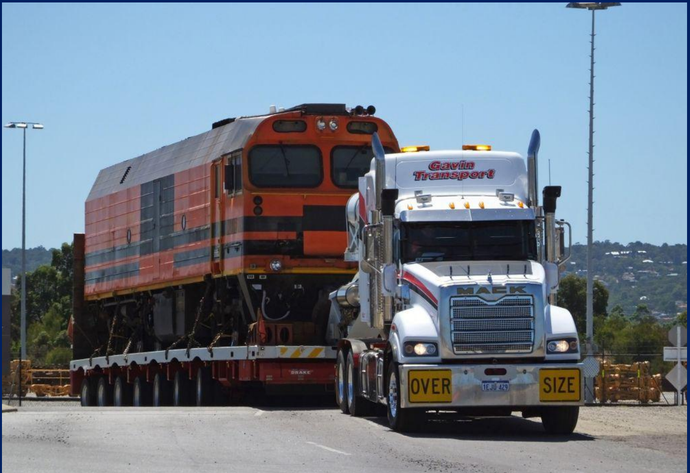
NJ1605 being hauled out of hardstand loading area Forrestfield on January 5th.