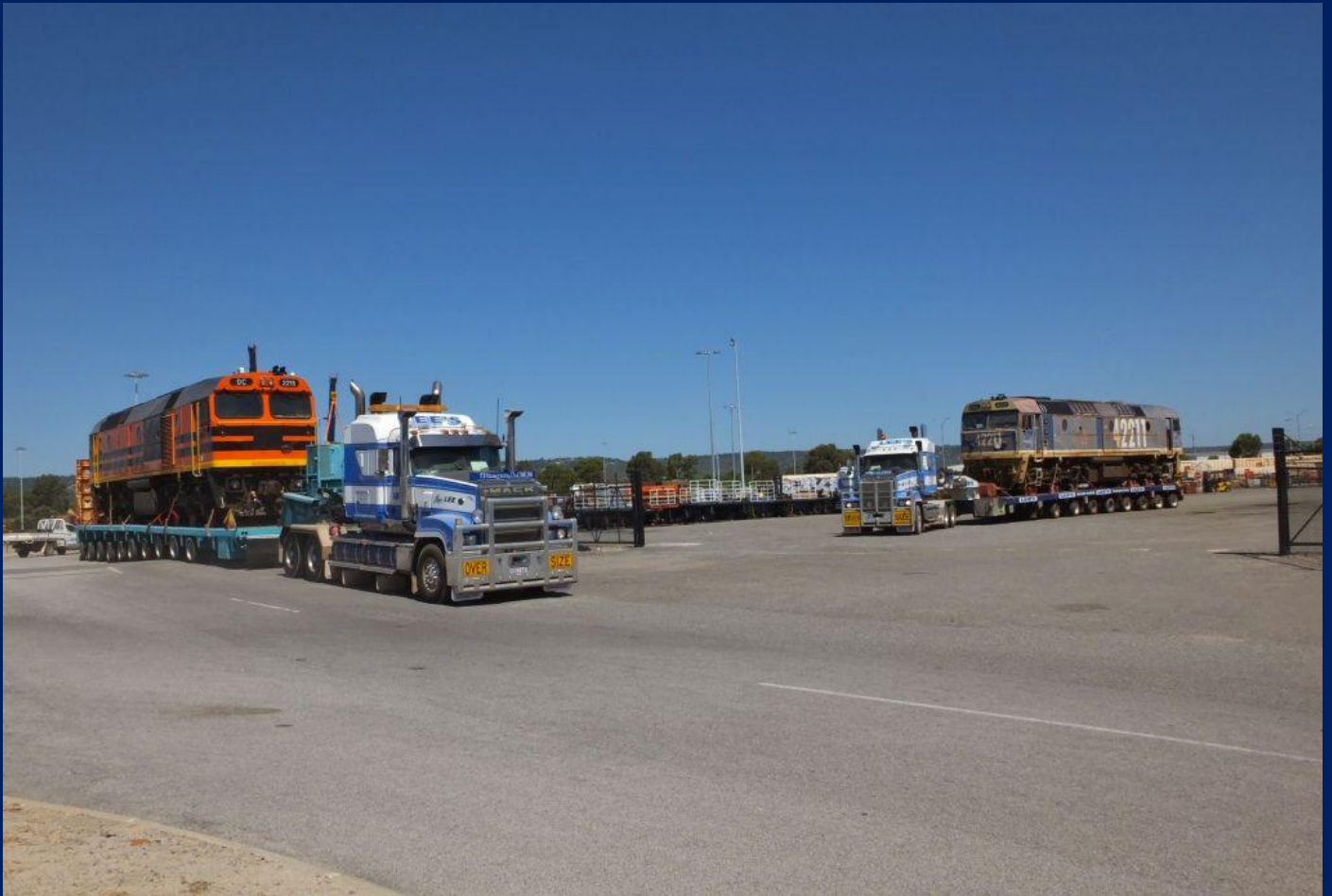
DC2215 heading out of loading site with 42211 to follow as they head to Fremantle port on January 4th.