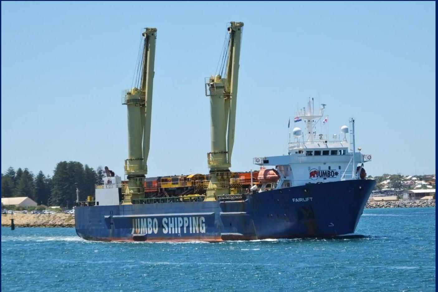
MV Fairlift coming out of Fremantle Harbour on January 10th.