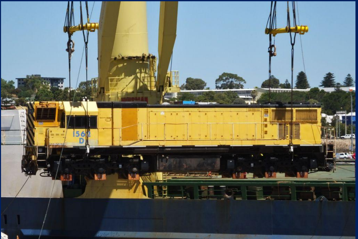
D1562 being swung on board MV Fairlift at #11 berth North Wharf Fremantle port January 8th.