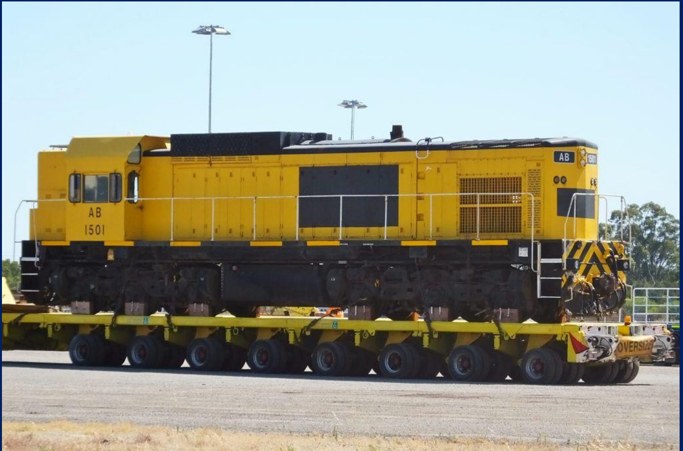
AB1501 on transport float at Forrestfield January 5th.