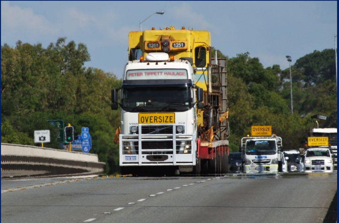
DE1251 crossing Stirling Bridge at Fremantle, note all traffic held by escort vehicles 5/1.