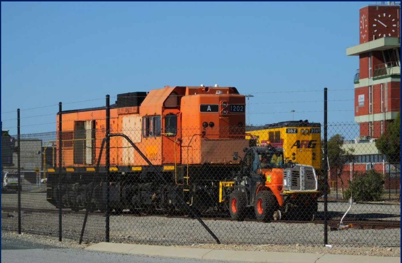
Shunting tractor pushing A1202 to hardstand January 7th it will be last locomotive to be lifted on 8/1.