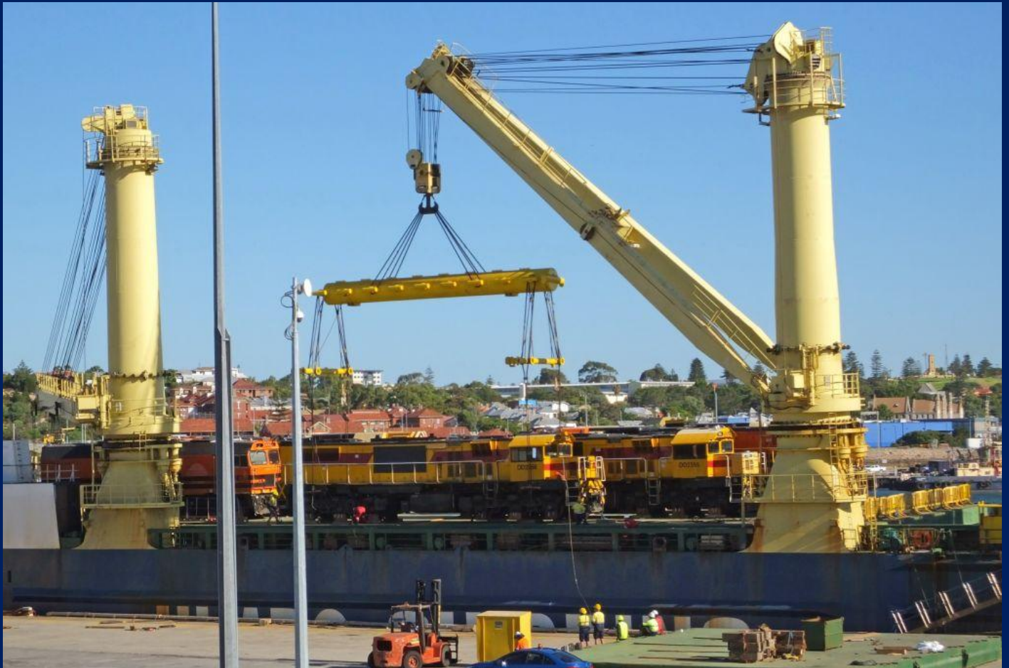
DD2356 being lowered into position on deck of MV Fairlift at #11 North Wharf on January 8th.