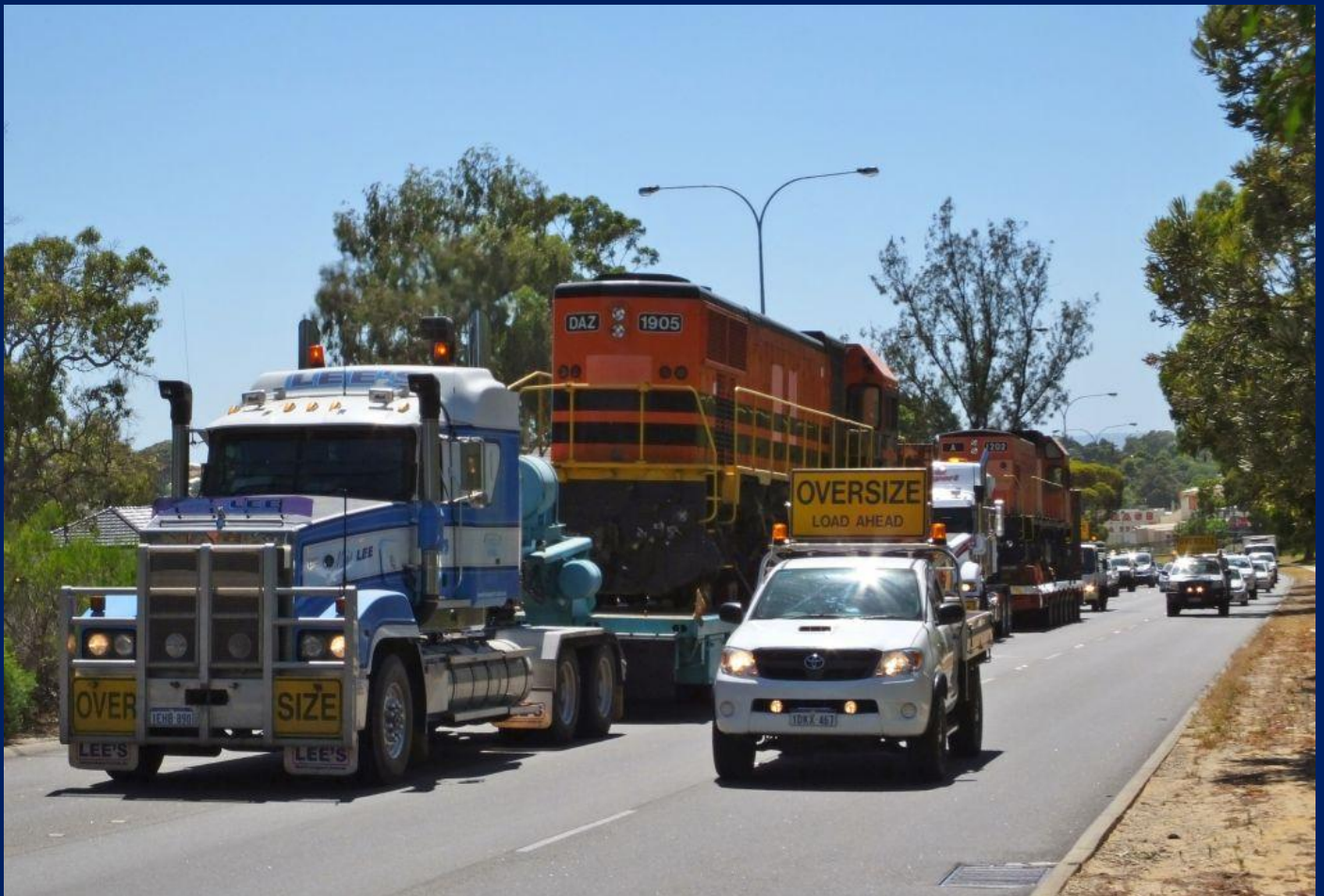
DAZ1902 & A1202 on Leach Highway being hauled up the hill in Palmyra on the way to Fremantle 8/1.