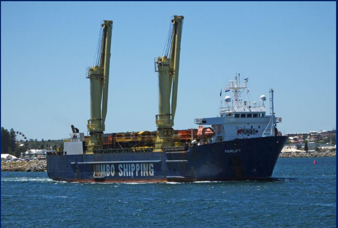
MV Fairlift departing Fremantle Harbour at start of its long journey to Durban in South Africa on 10/1.