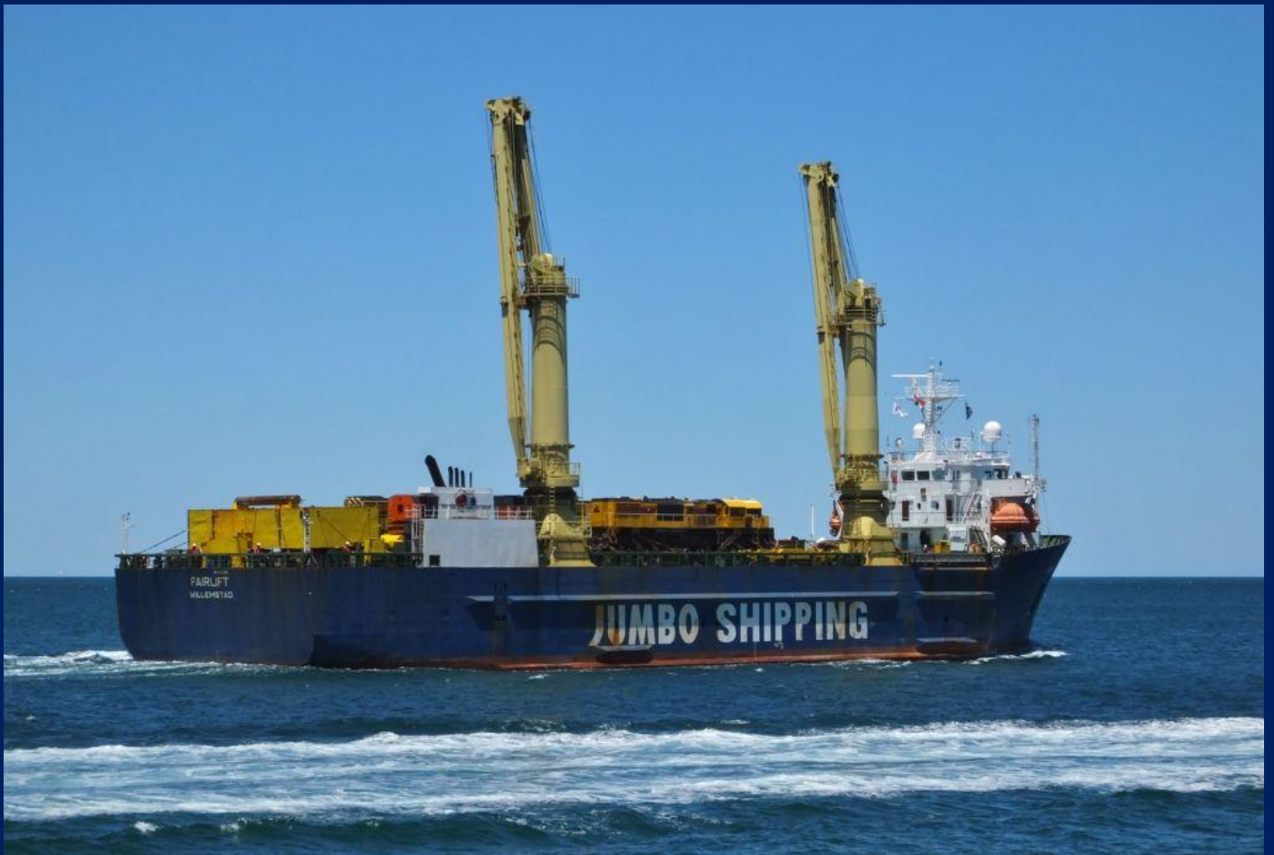
MV Fairlift about to turn north into Gage Roads on January 10th.