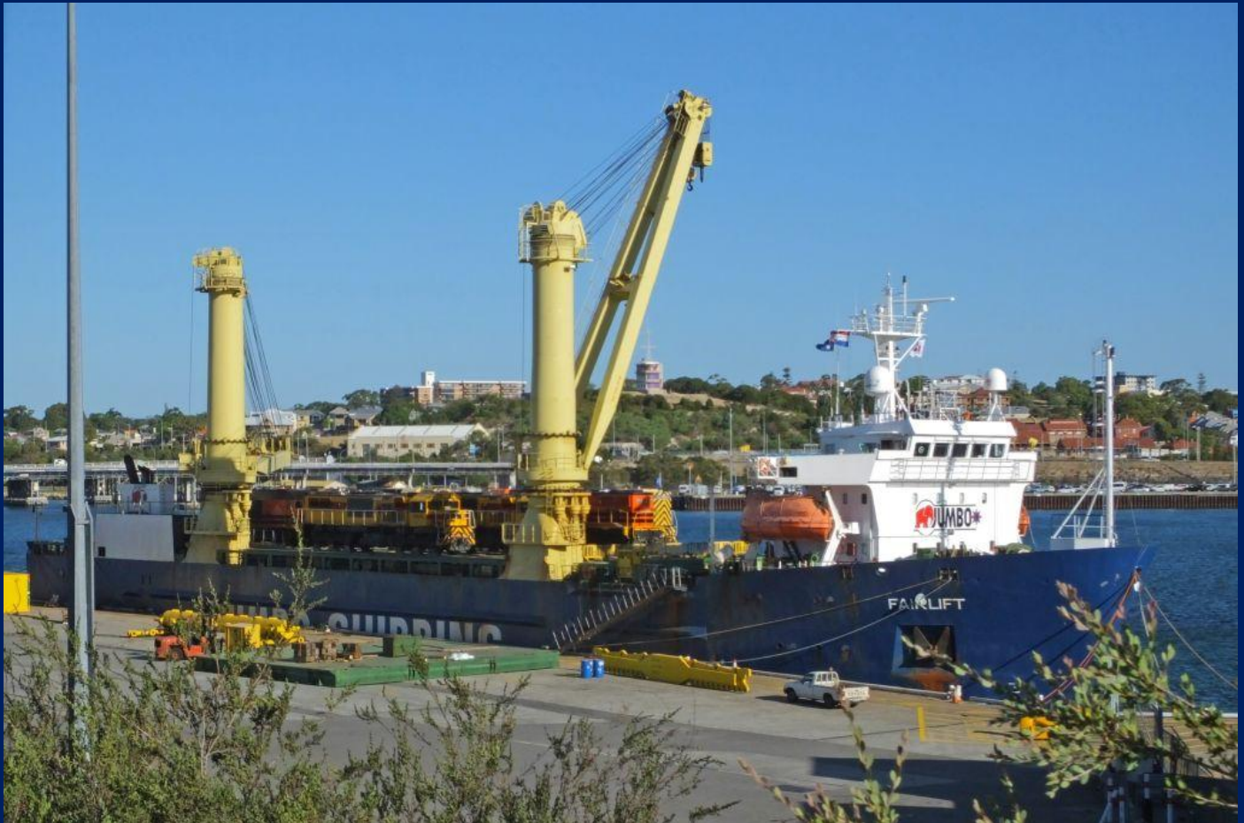
Both photos; MV Fairlift with all its cargo loaded at #11 North Wharf January 8th.