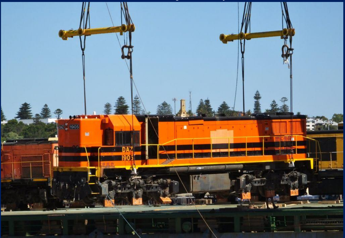
DAZ1905 being hoisted onboard MV Fairlift at #11 North Wharf January 8th.