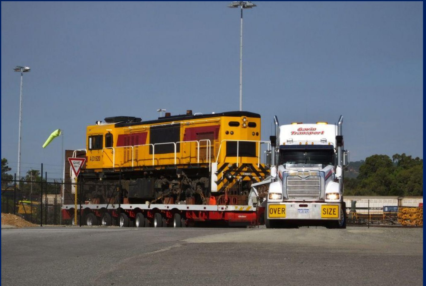
AD1520 being hauled out of the hardstand area to parking lot before going to Fremantle port on January 6th.