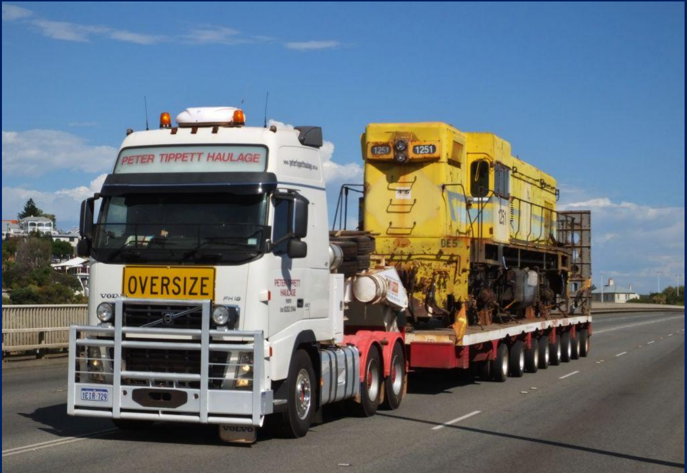
DE1251 being hauled over empty an Stirling Bridge at Fremantle January 5th.