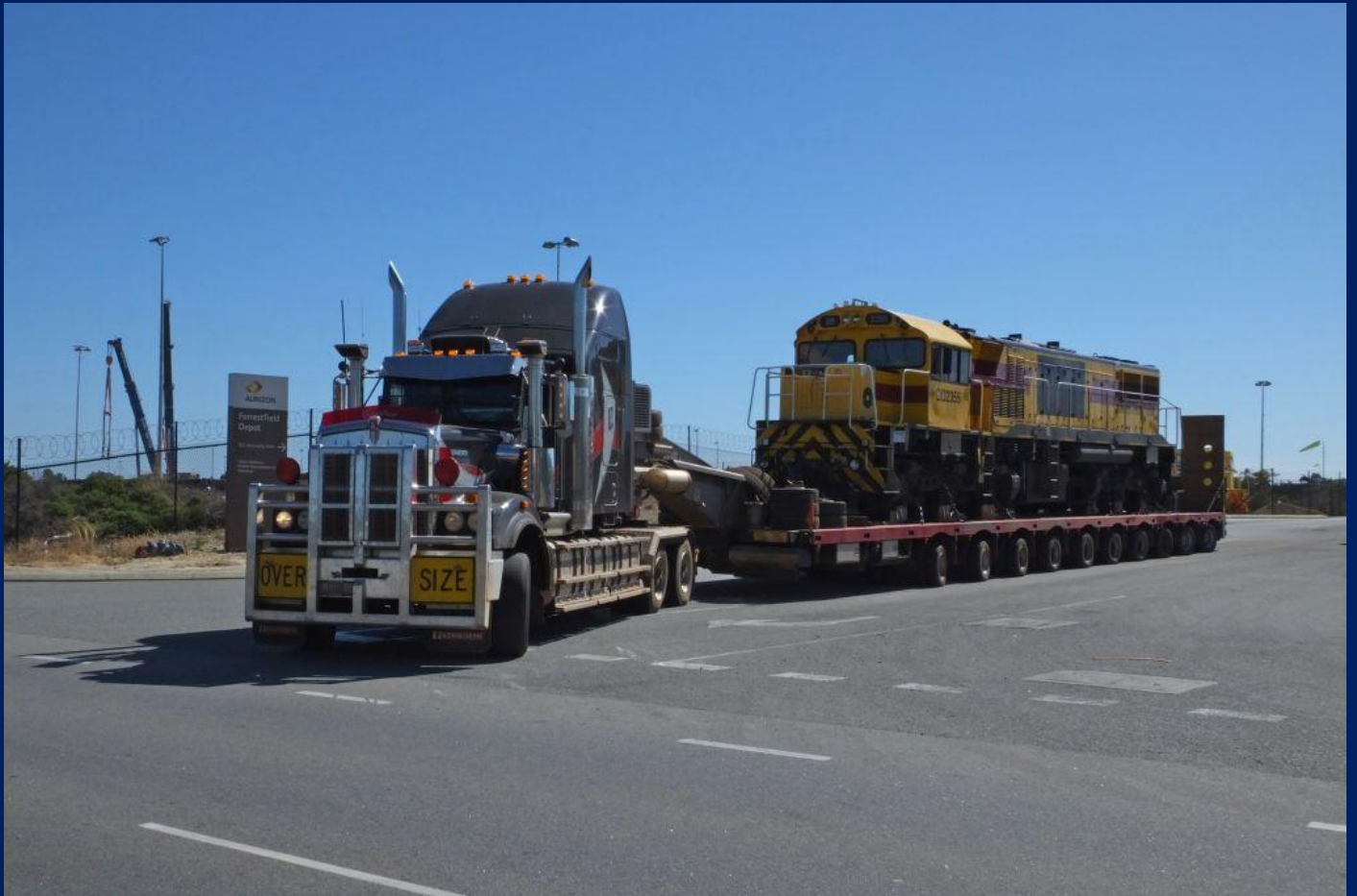
DD2355 departing Forrestfield for Fremantle port note heavy lift cranes in hardstand January 7th.