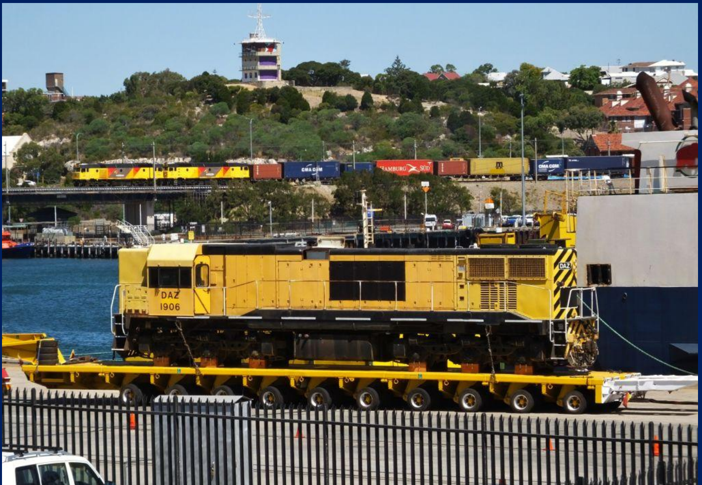
DC2205 & DC2213 haul 5144 container train over Fremantle Railway Bridge with DAZ1906 on wharf 8/1.