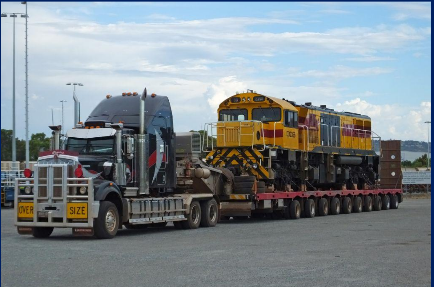
DD2358 loaded waiting at Forrestfield to go to Fremantle port January 5th.