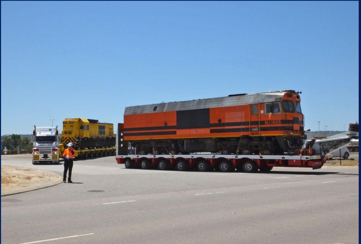
NJ1605 about to turn onto heavy haul route to Fremantle port with AB1501 following January 5th.