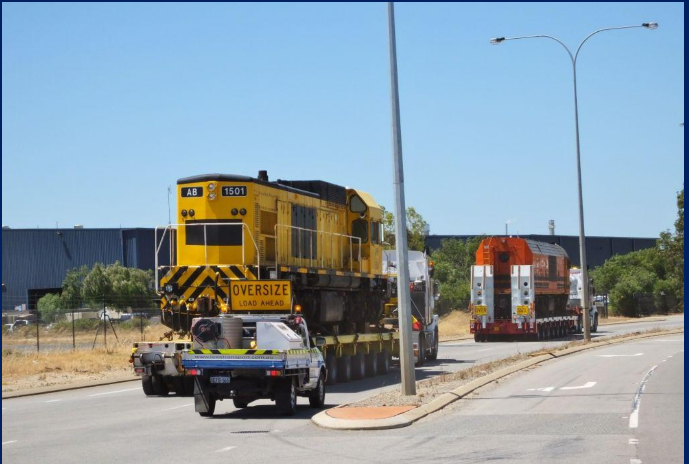
NJ1605 & AB1501 departing Forrestfield on heavy haul route to Fremantle port on January 5th.