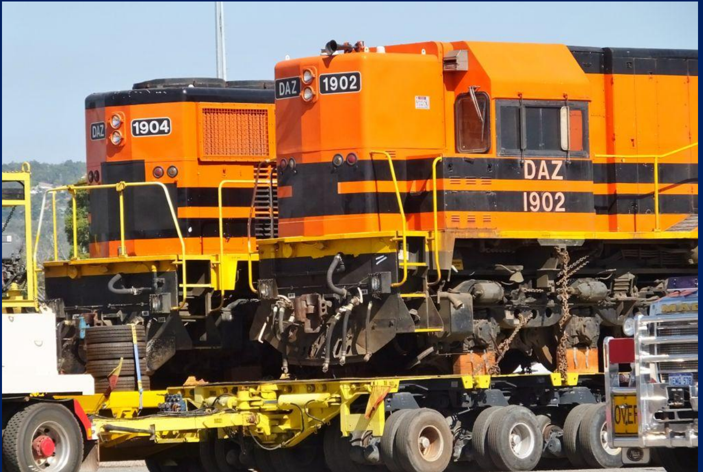
DAZ1904 & DAZ1902 parked side by side waiting to go to Fremantle port January 6th.