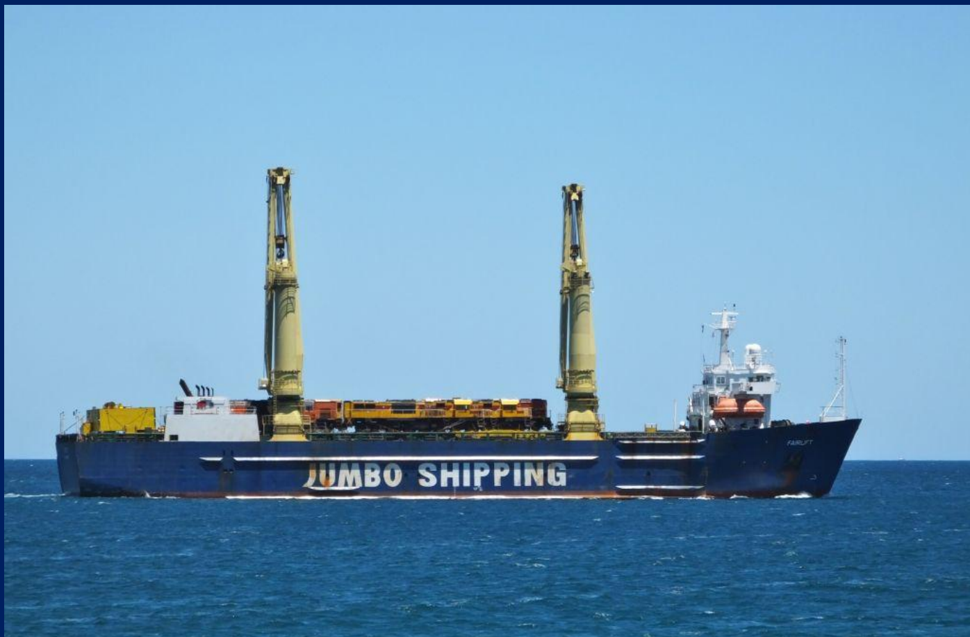
MV Fairlift heading north before heading west and destination Durban South Africa on January 10th.