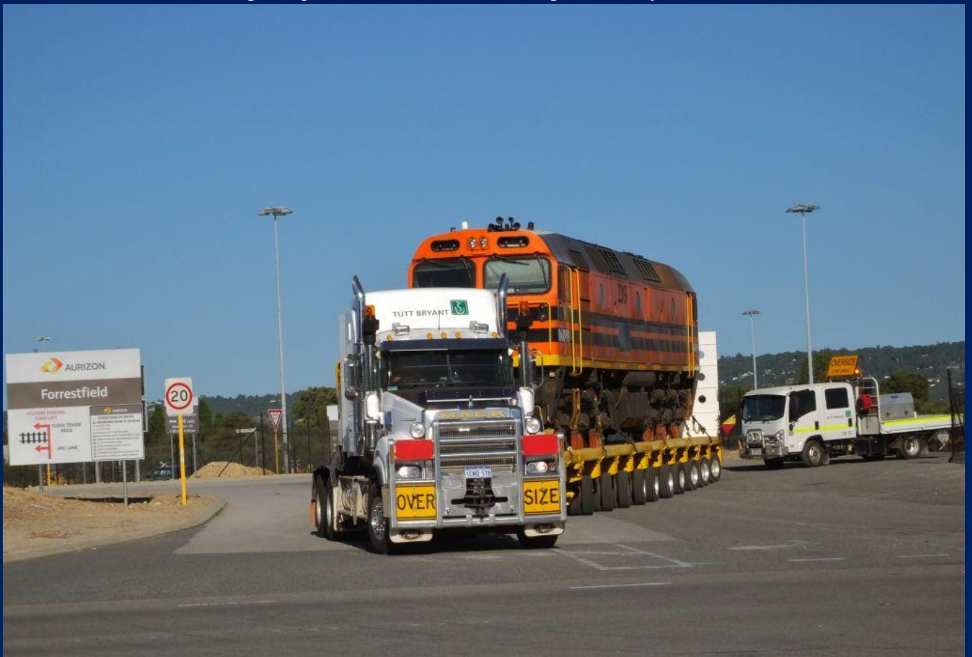
2203 about to turn onto Abernathy Road on way to Fremantle port January 4th.