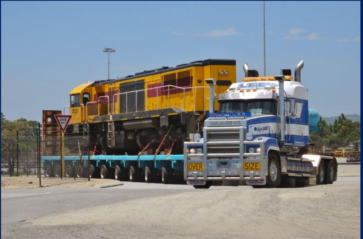
DD2357 being hauled out of hardstand area on January 6th.