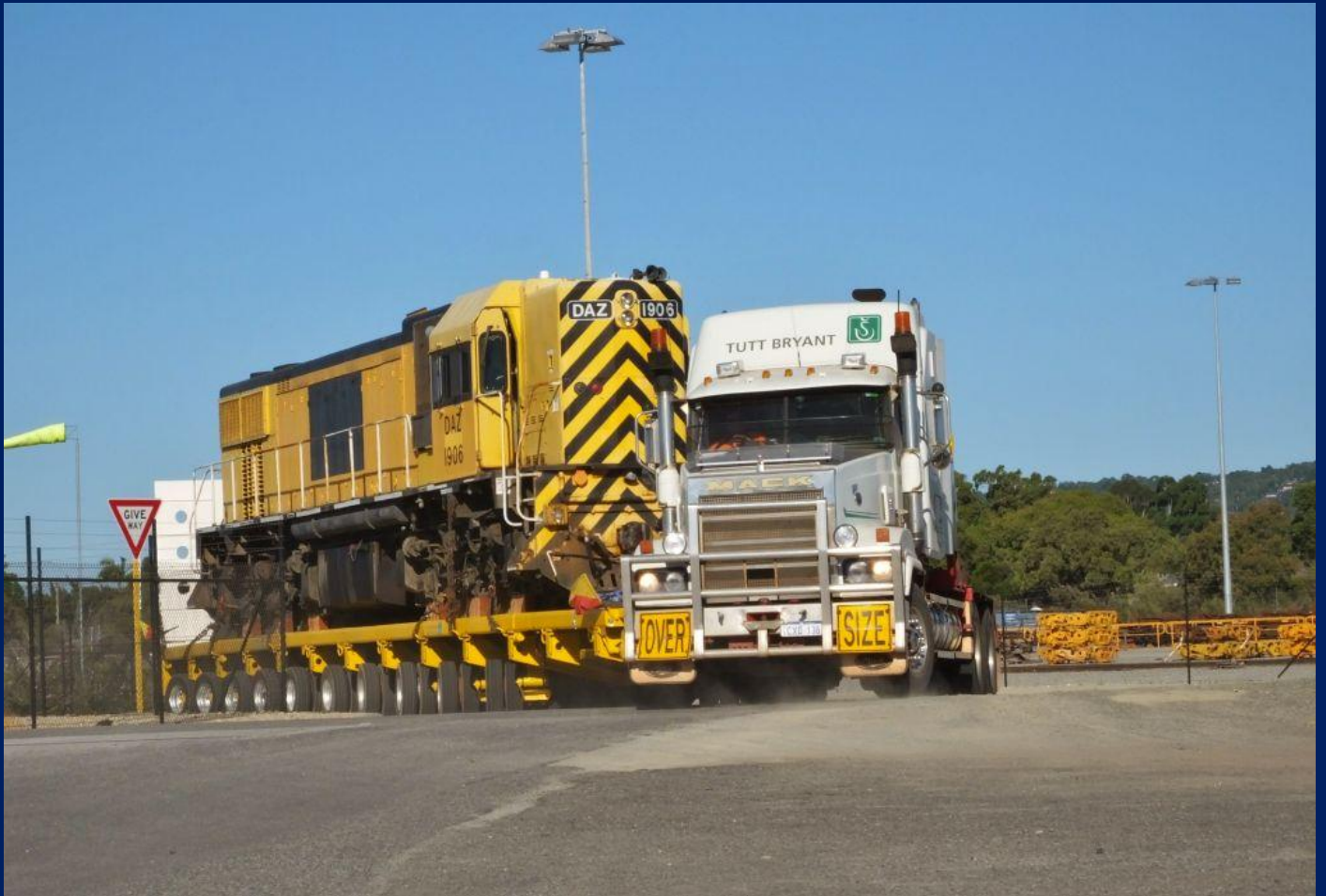
DAZ1906 after loading being hauled out of hardstand to the parking lot at Forrestfield on January 7th.