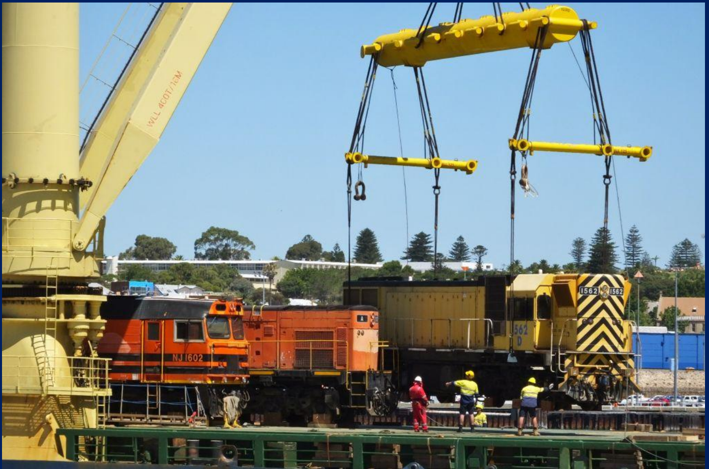
D1562 being moved into position on the deck next to A1202 on January 8th.