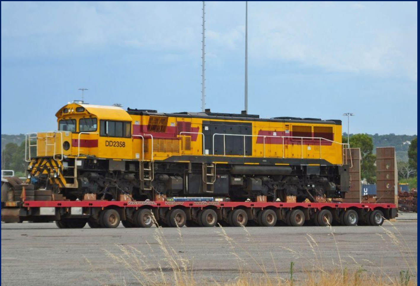
DD2358 on transport float at Forrestfield January 5th.