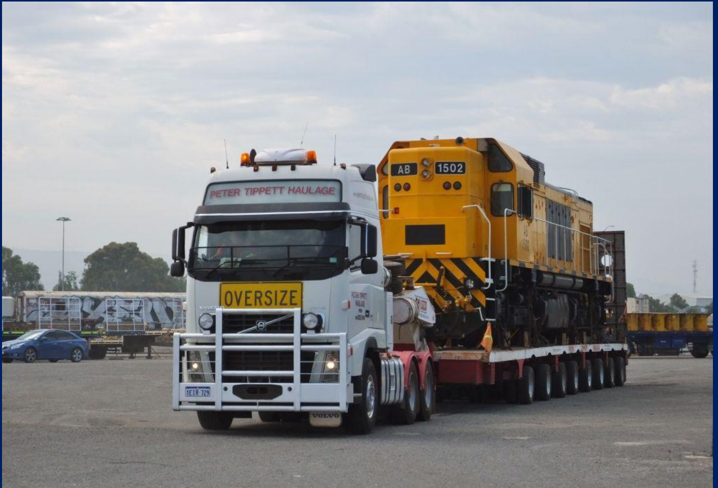
AB1502 waiting to head to Fremantle port January 6th.