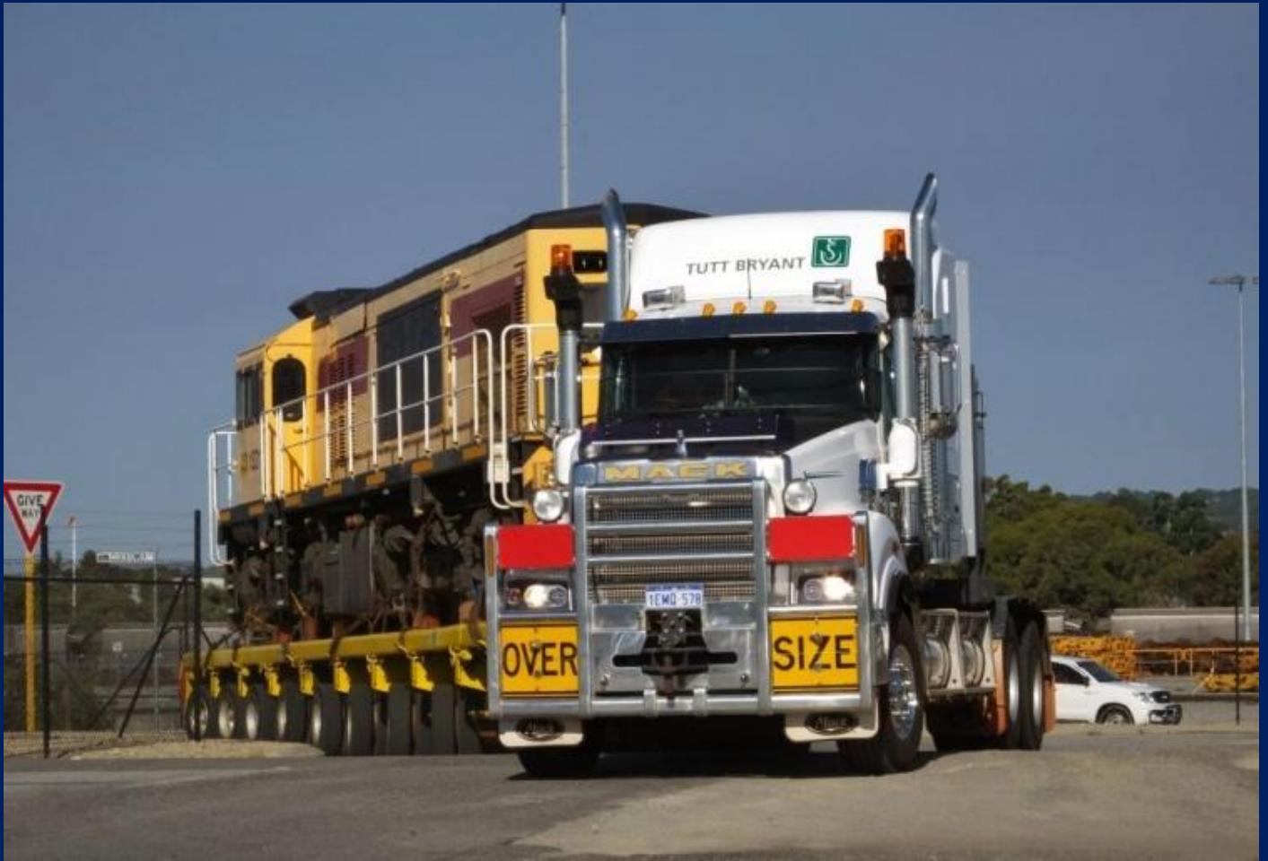
AD1521 being hauled out the hardstand area to join locomotives already in parking lot at Forrestfield 6/1.