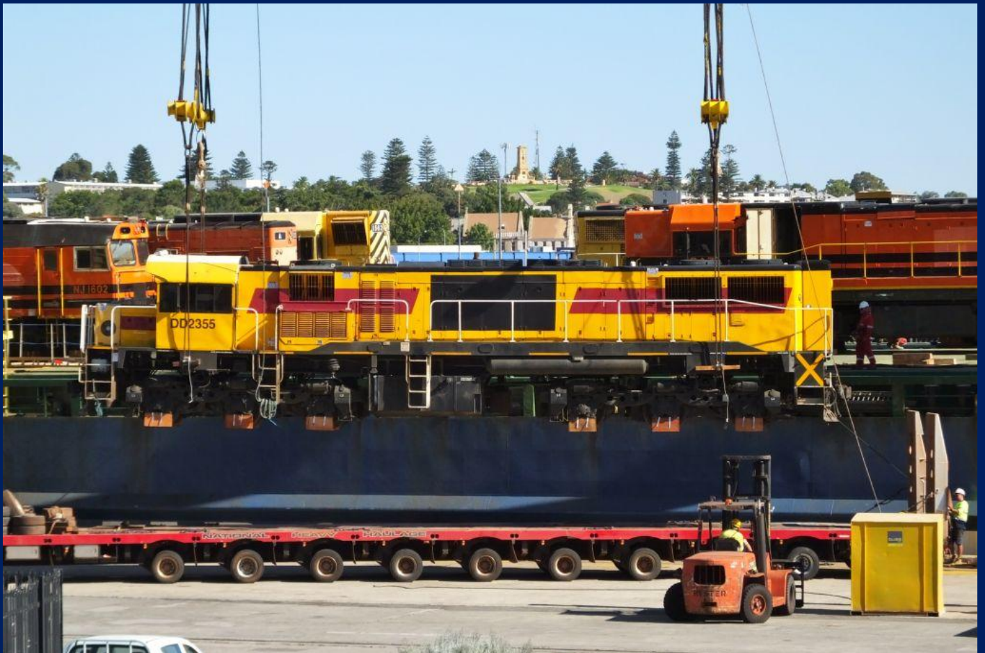
DD2355 being hoisted on board MV Fairlift at North Wharf on January 8th.