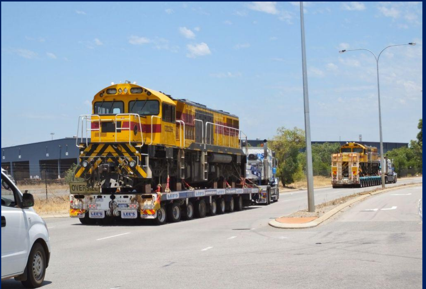
DD2359 & DD2357 departing Forrestfield on way to Fremantle port on January 6th.