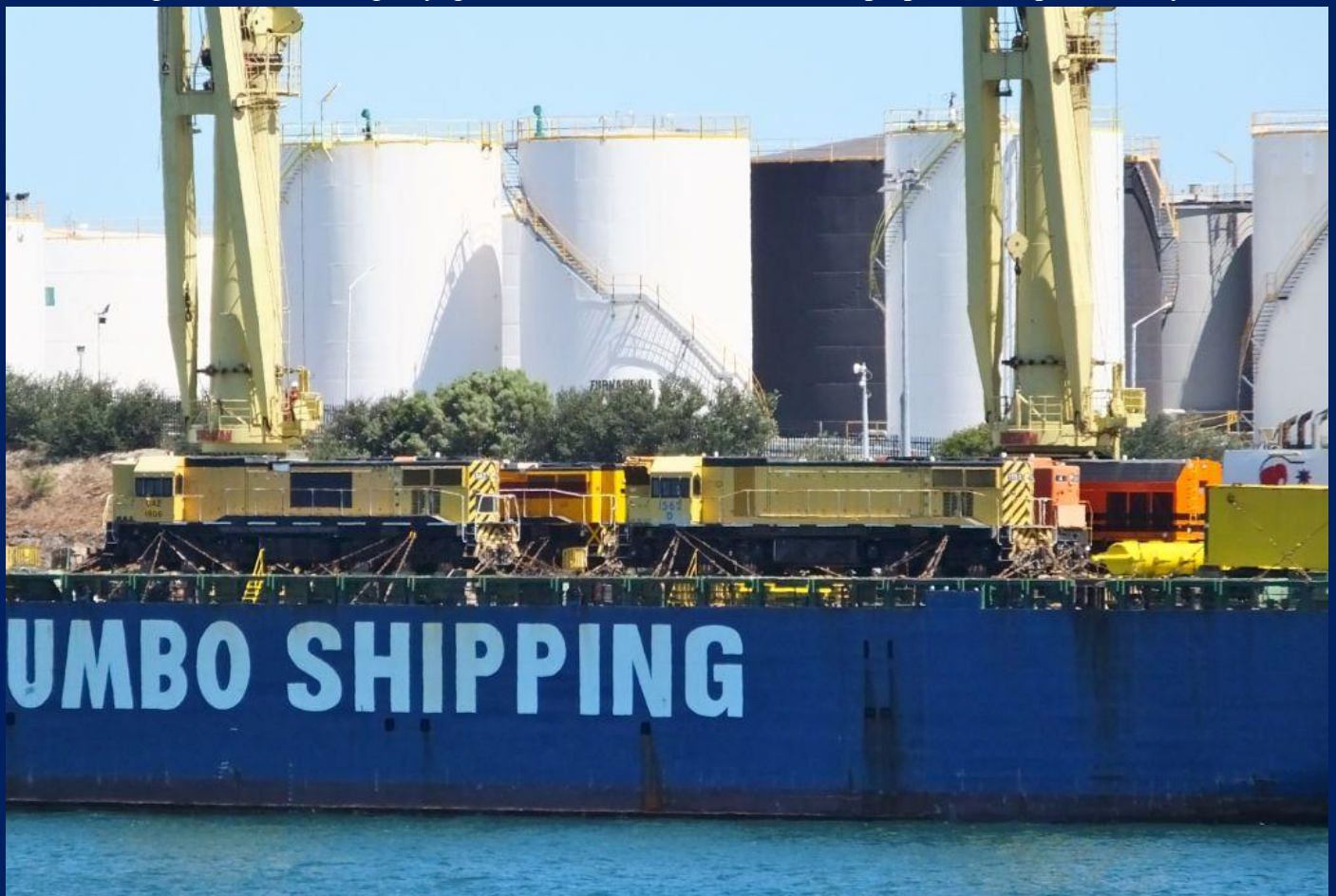
Deck cargo on MV Fairlift at #11 North Wharf secured ready to depart January 10th.