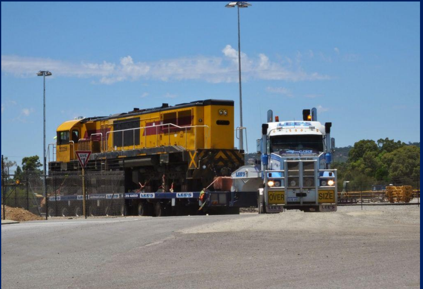
DD2356 coming out of loading area at Forrestfield January 7th.