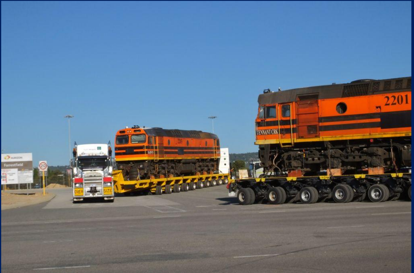
2201 with 2203 behind it departing Forrestfield for Fremantle port January 4th.