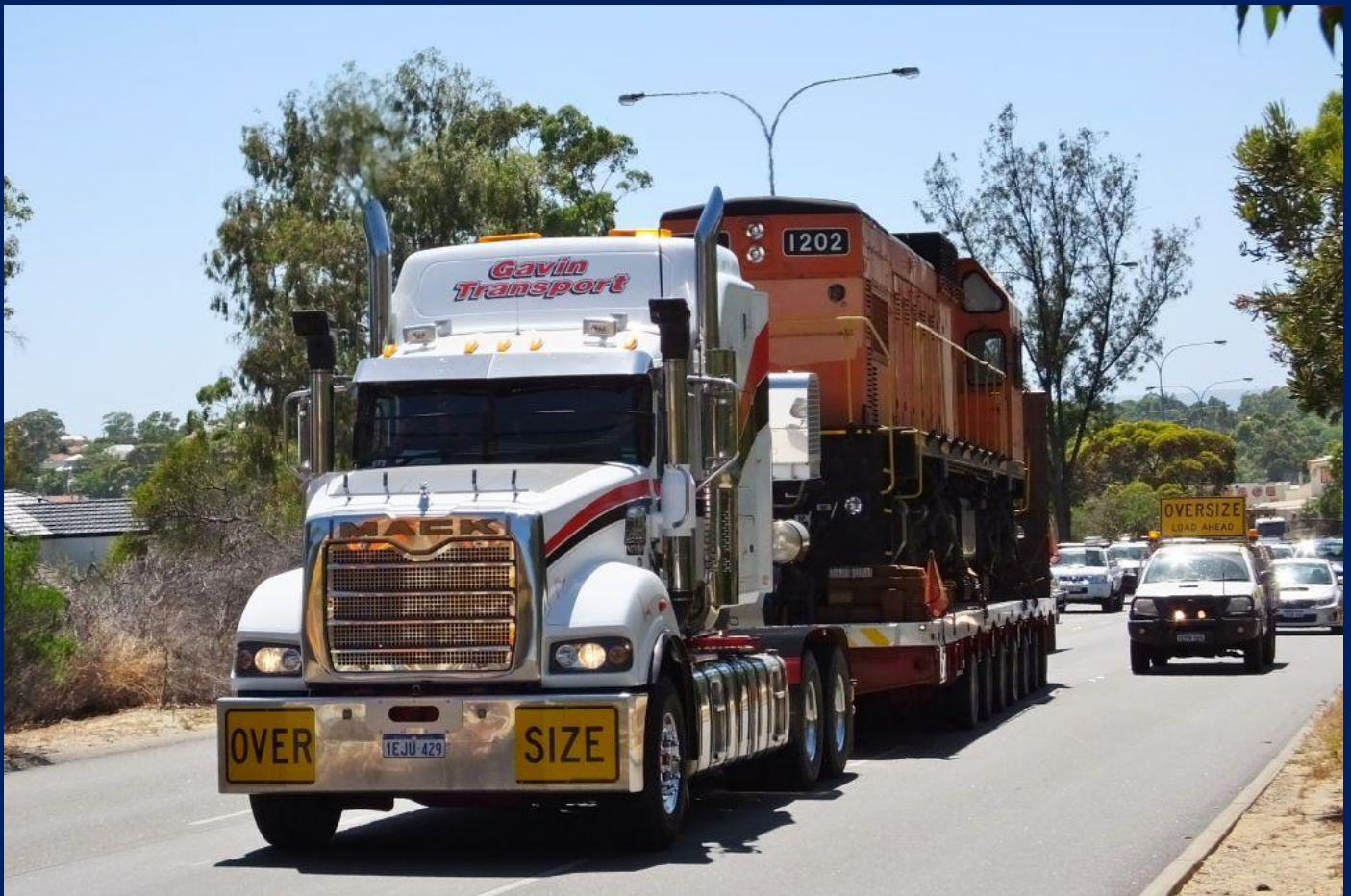
A1202 being hauled up hill at Palmyra with escort vehicles holding traffic behind these large loads 8/1.