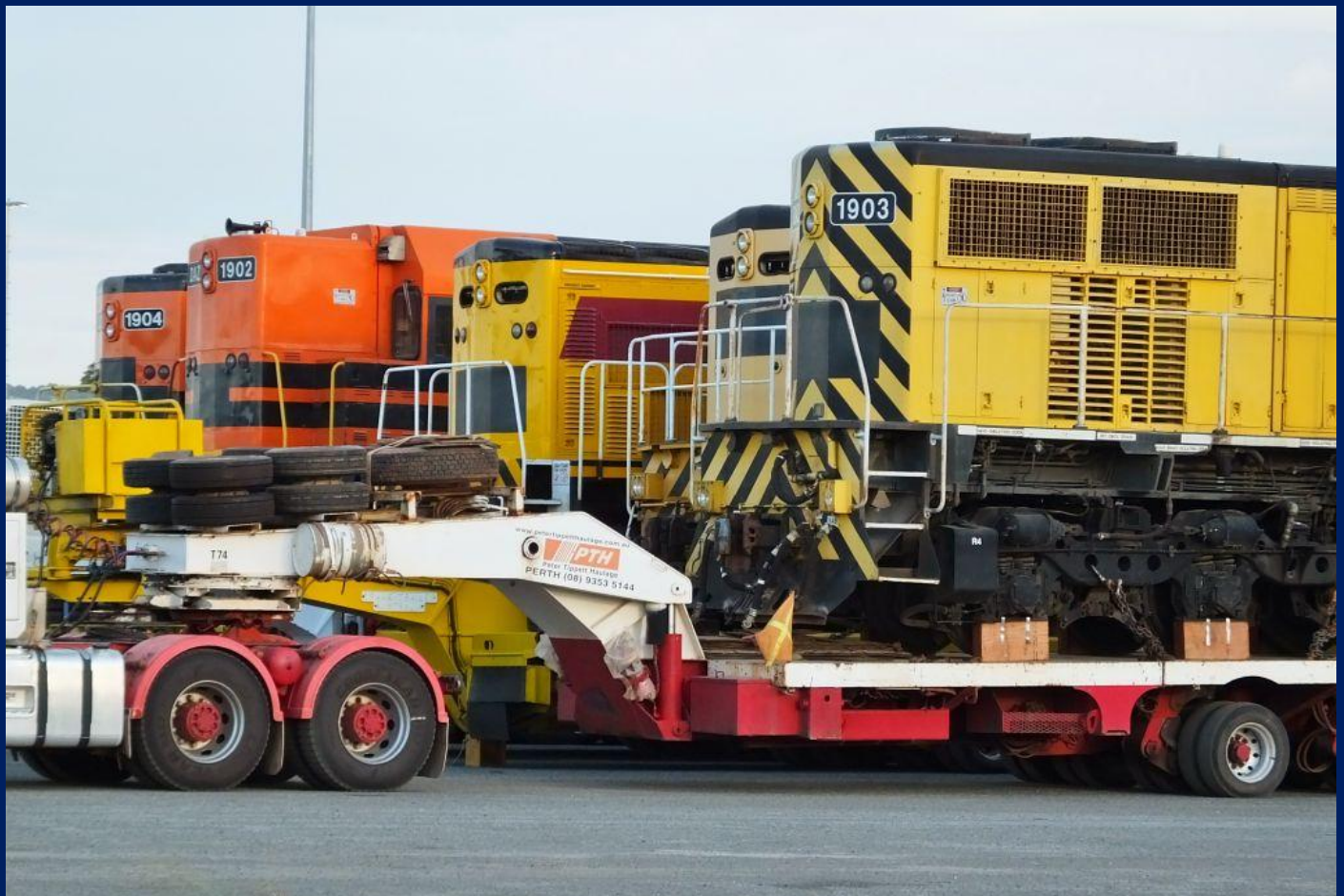
DAZ1903, AD1521, AD1520, DAZ1902 & DAZ1904 lined up in parking lot at Forrestfield January 6th.