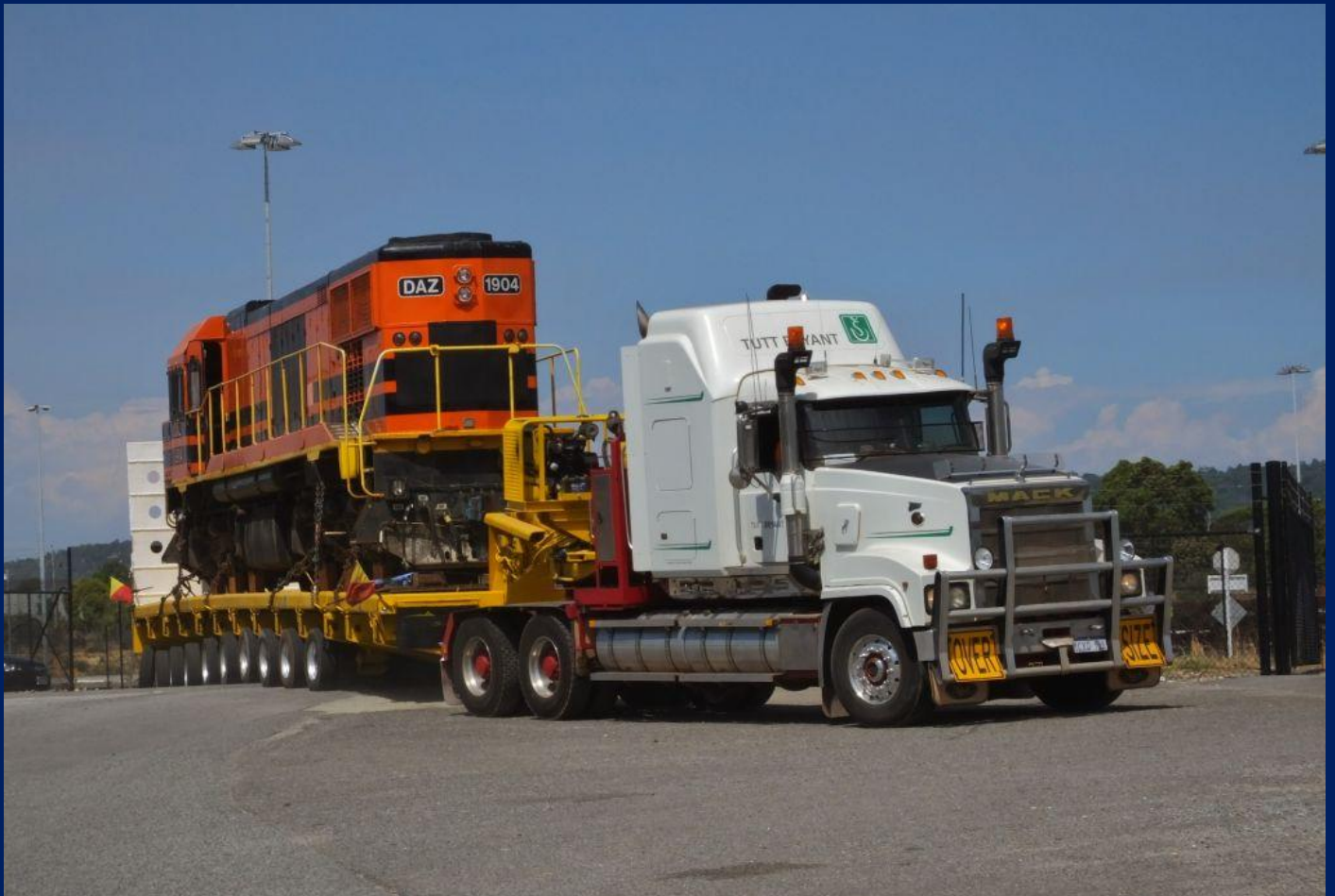
DAZ1904 being hauled out of hardstand to join DAZ1902 on January 6th.