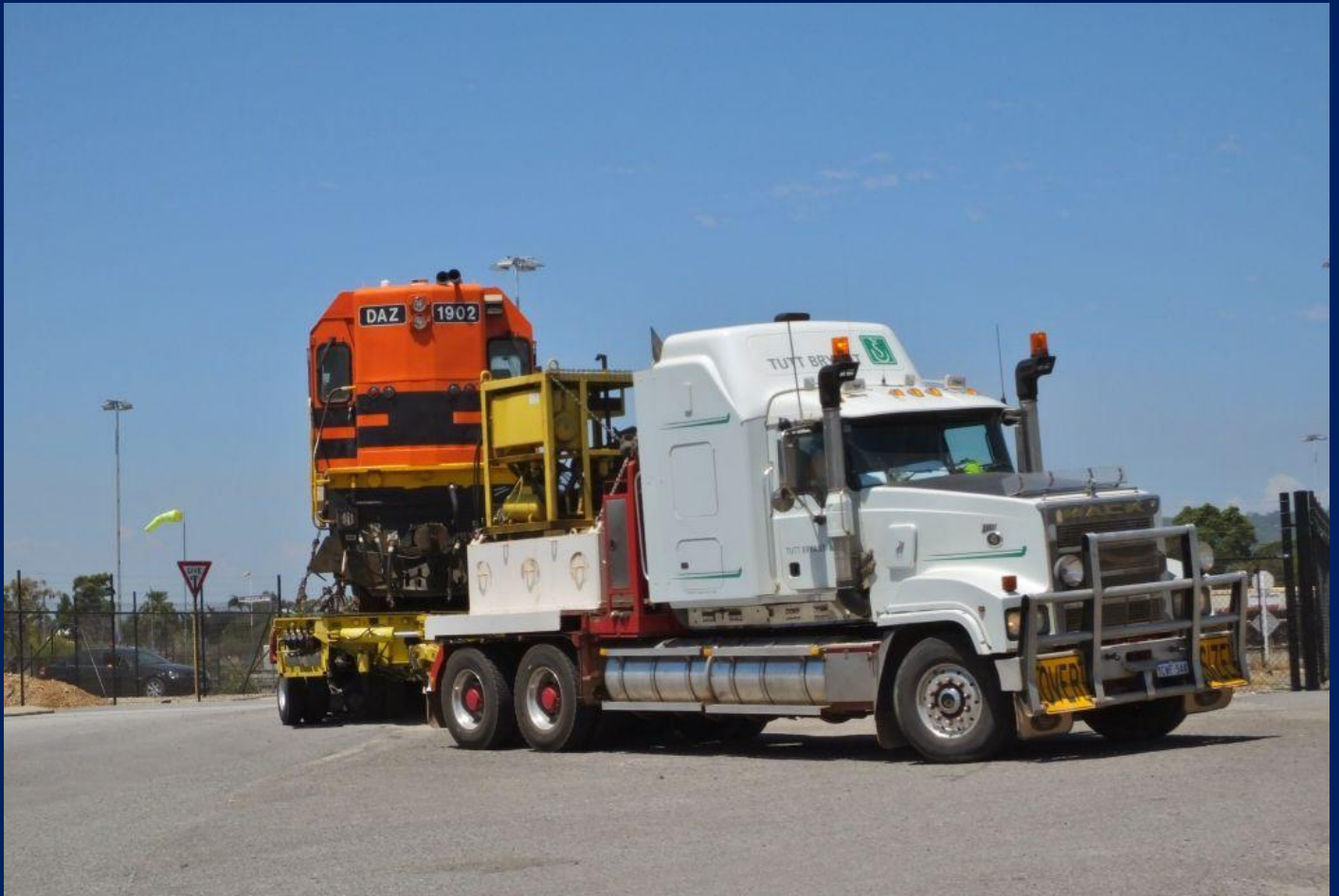
DAZ1902 about to enter parking lot where they are held till leave for Fremantle port on January 6th.