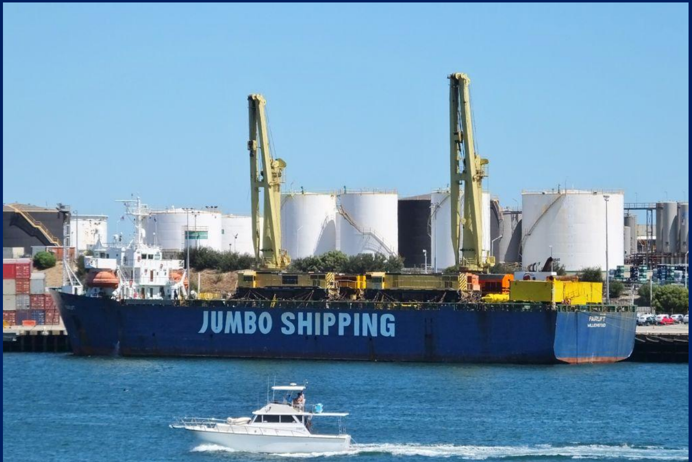
All deck cargo secured for long voyage to South Africa as MV Fairlift prepares to depart January 10th.