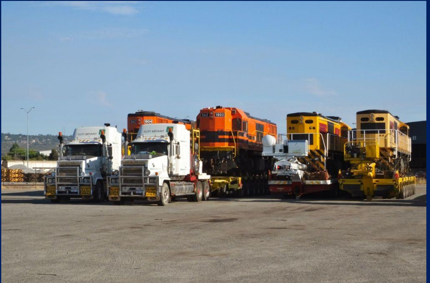
DAZ1904, DAZ1902, AD1520 & AD1521 parked up at Forrestfield waiting to go to Fremantle port 6/1.