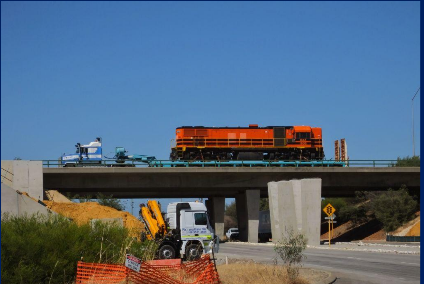
DAZ1904 on Tonkin Highway Bridge as crosses over Abernathy Road on way to Fremantle port on 8/1.