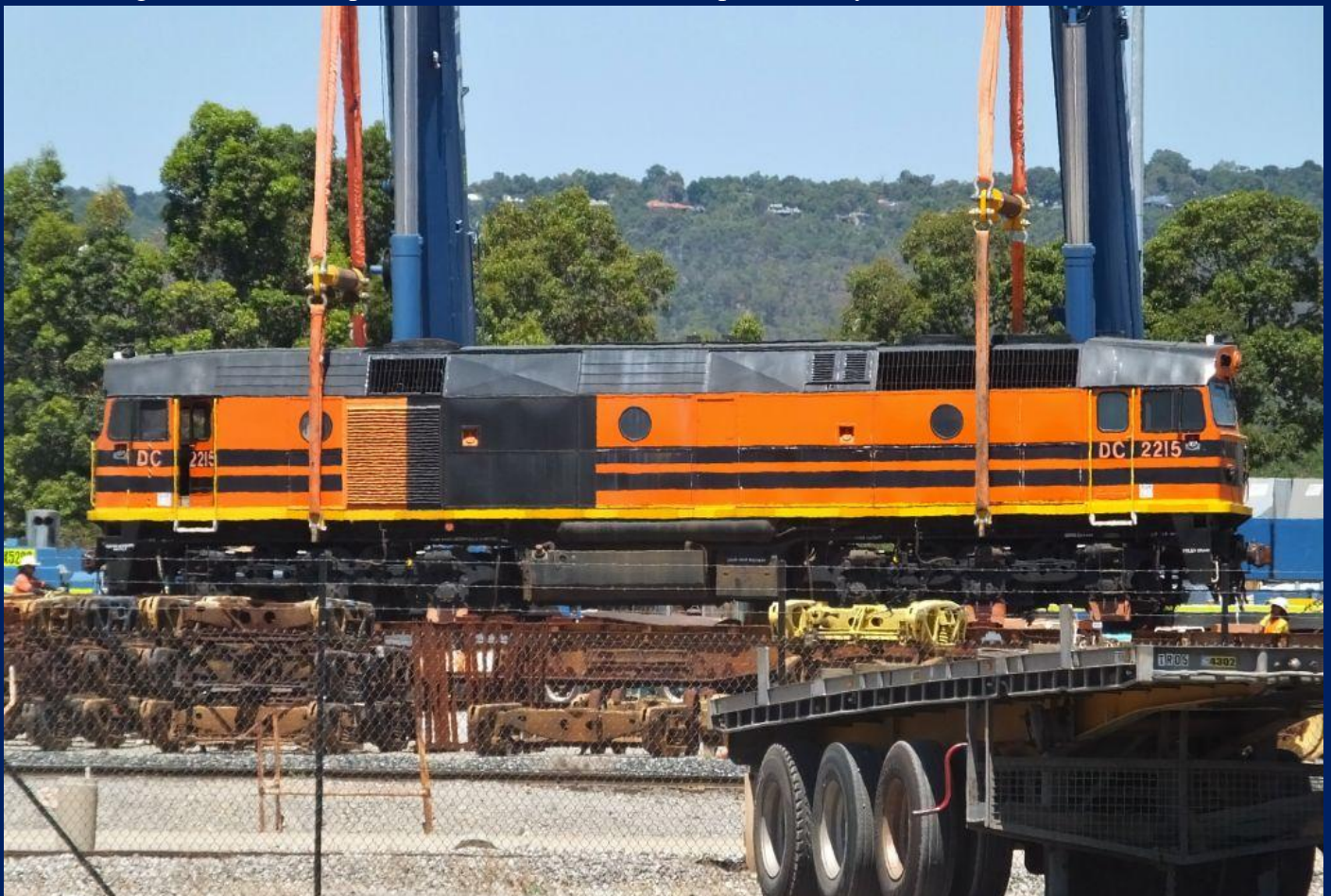
DC2215 being lifted onto transport float at Forrestfield on January 4th.