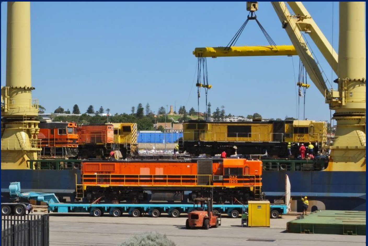
DAZ1905 on transport float with DAZ1906 above it being lowered onto MV Fairlift deck cargo 8/1.