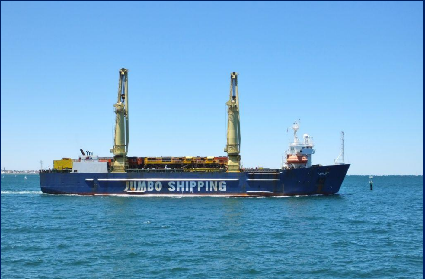
MV Fairlift at Fremantle Harbour entrance on January 10th.