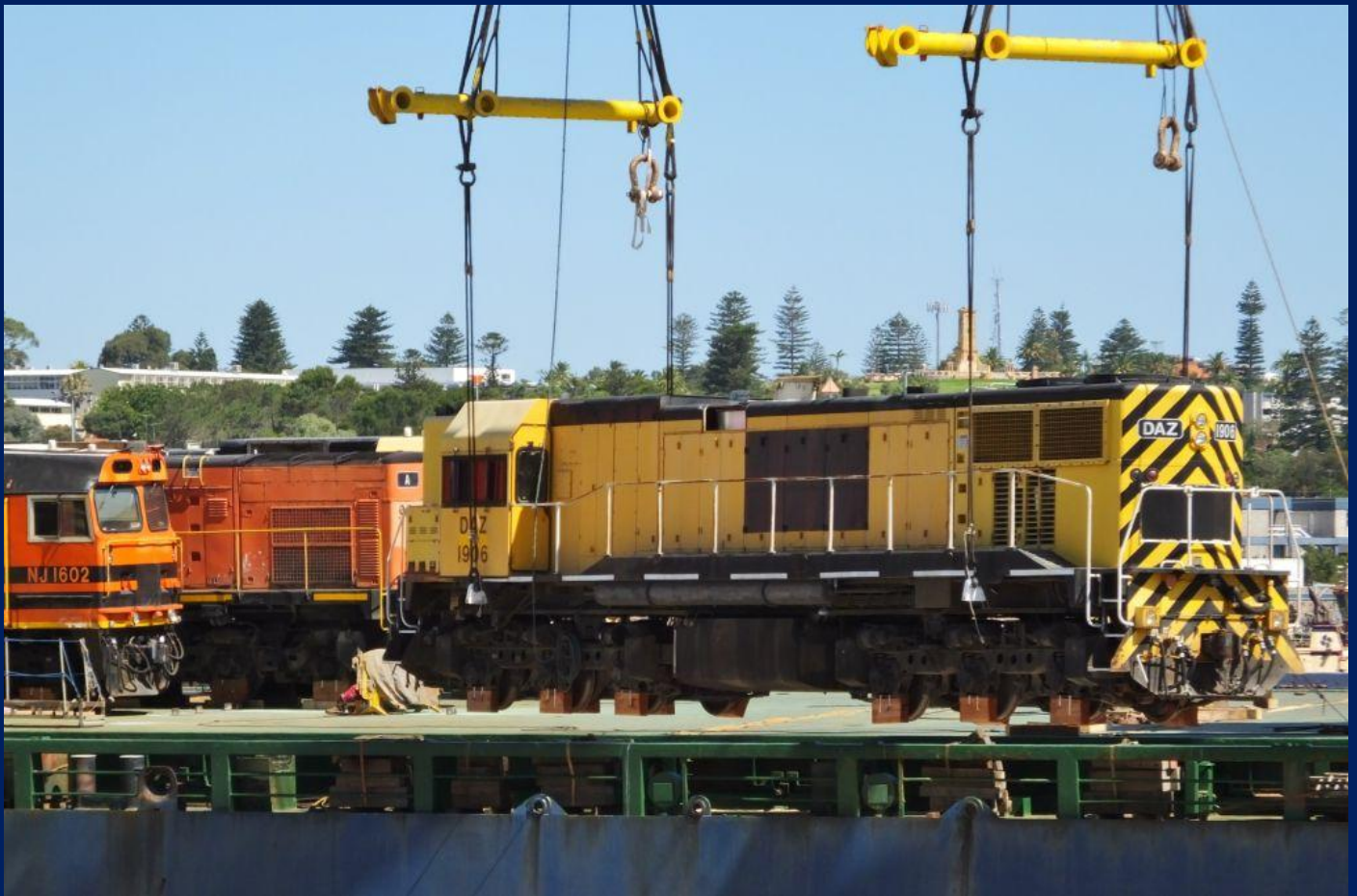
DAZ1906 being hoisted on board MV Fairlift as deck cargo on January 8th.