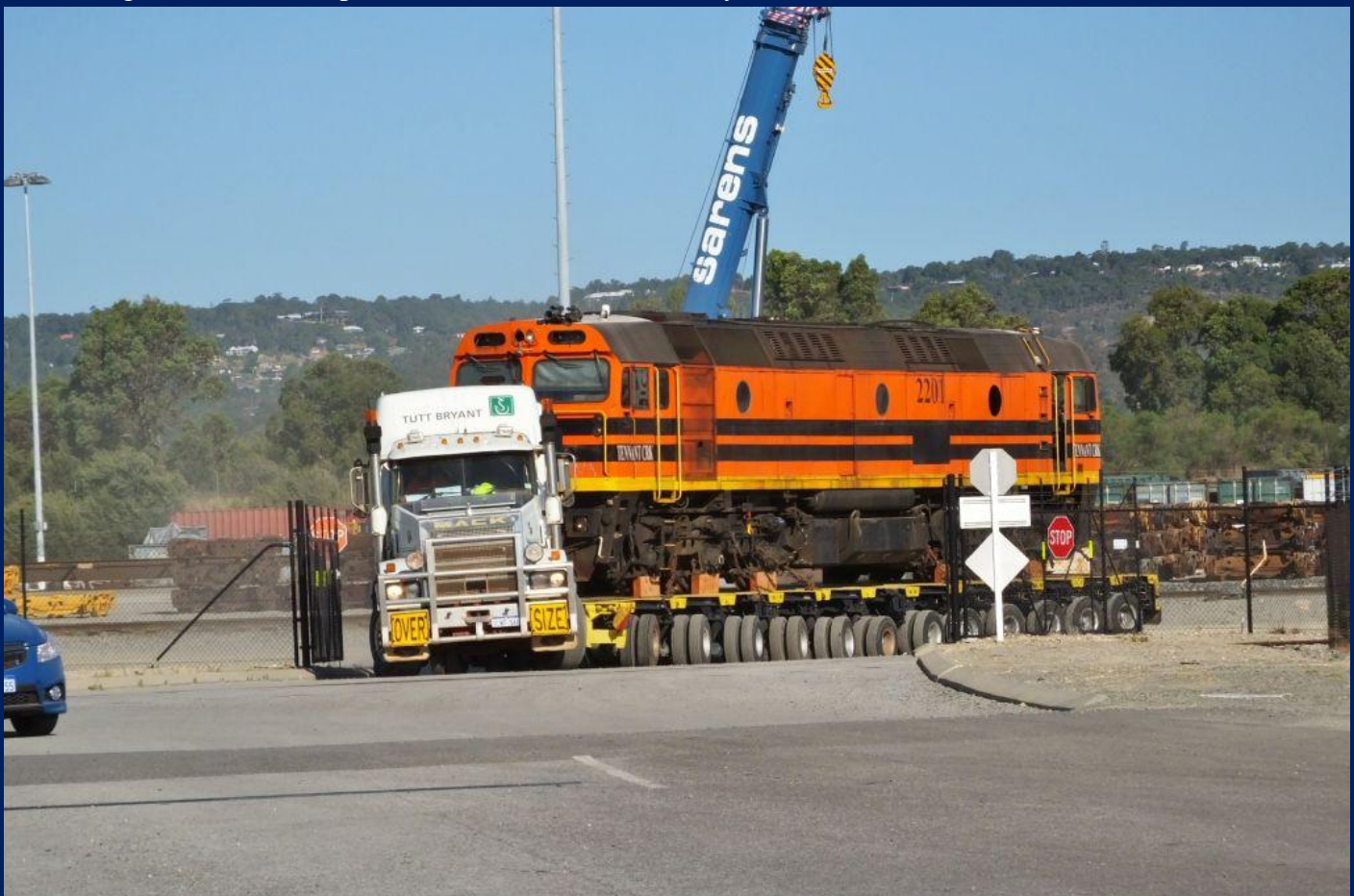
2201 being hauled out of loading site ready to depart for Fremantle port on January 4th.