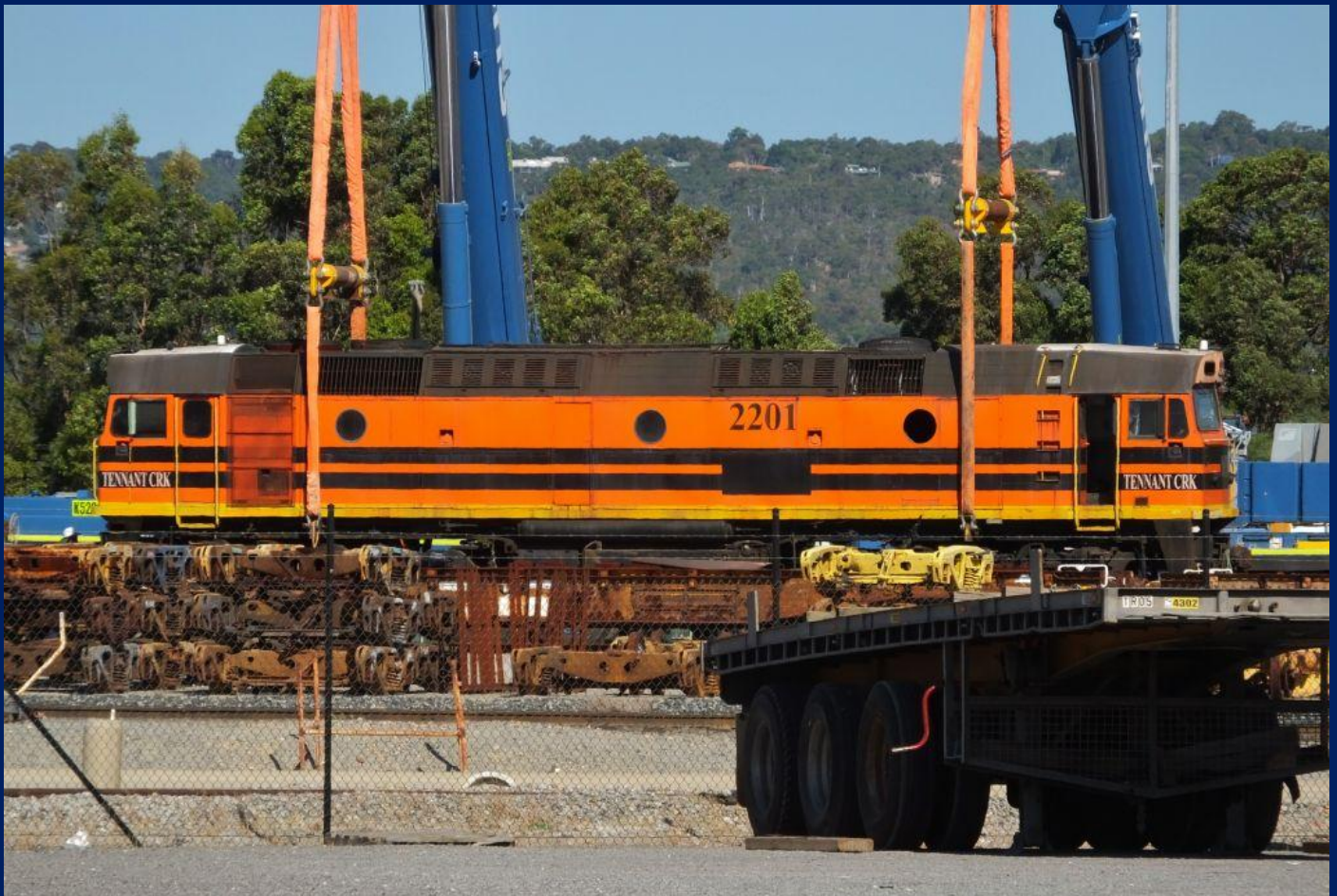
2201 being lifted onto transport float at Forrestfield January 4th.