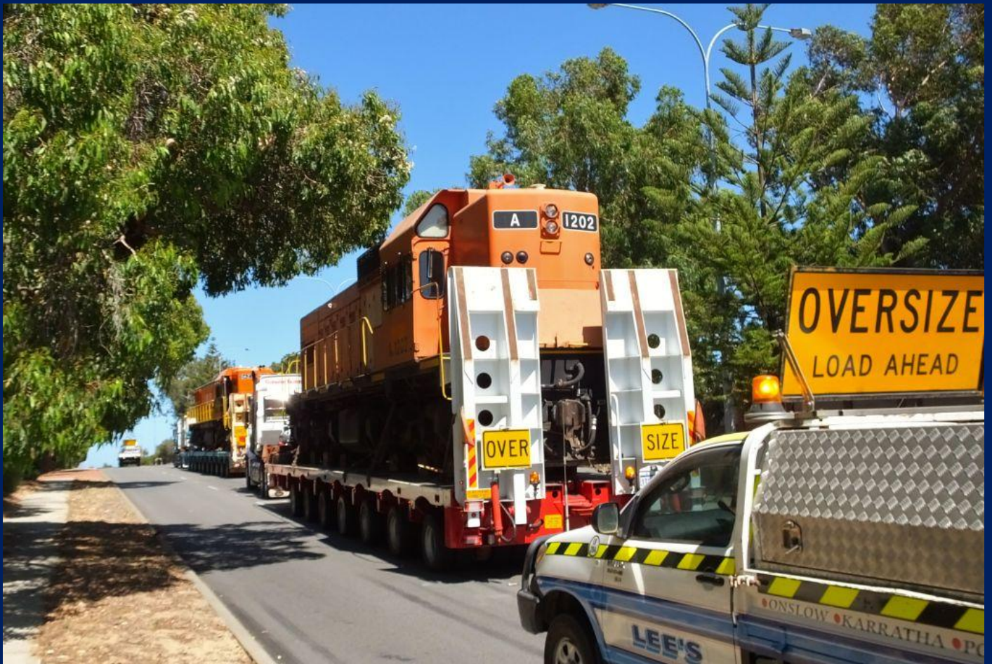
A1202 & DAZ1905 nearing the crest of hill at Palmyra January 8th.