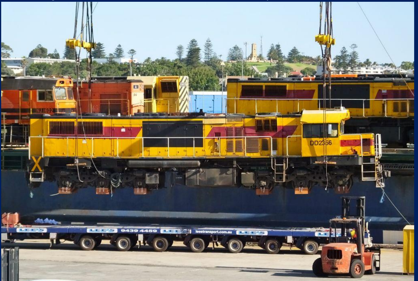
DD2356 the final locomotive hoisted on board MV Fairlift at #11 North Wharf January 8th.