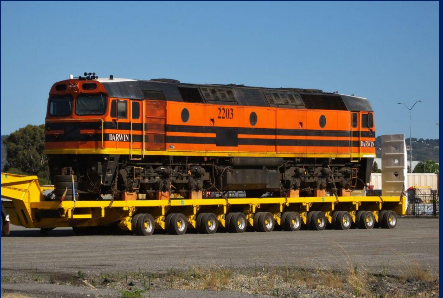
2203 on transport float in parking lot waiting for further locomotive to be loaded January 4th.