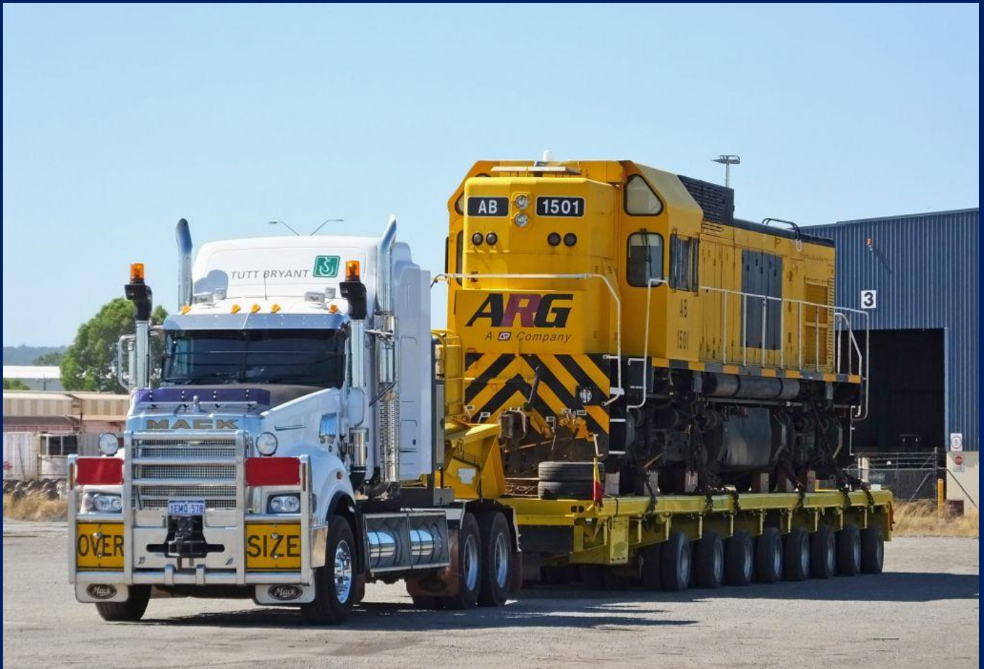
A1501 loaded waiting at Forrestfield to depart for Fremantle port January 5th.