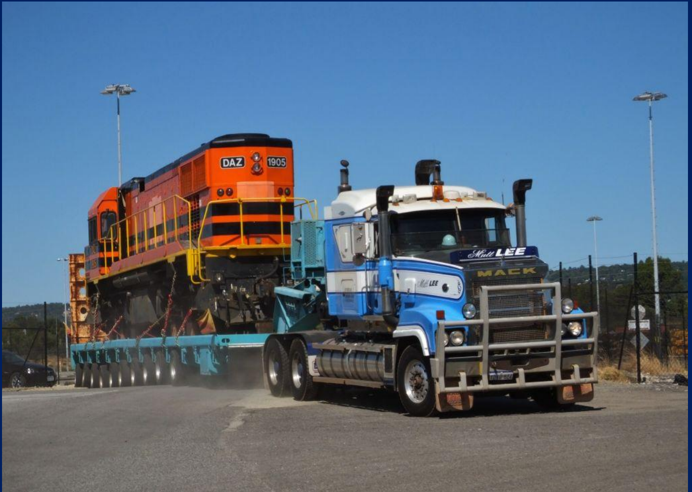
DAZ1905 on way to parking area Forrestfield January on 7th.