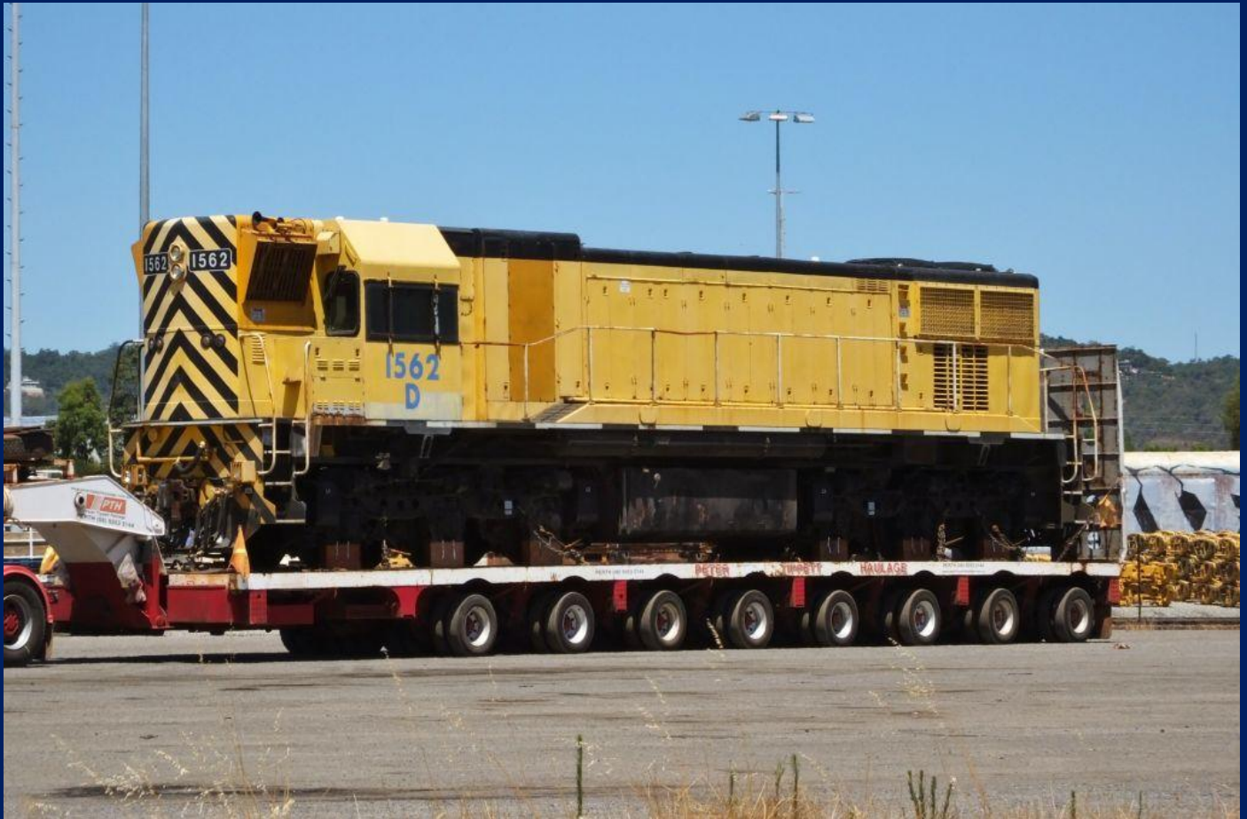
D1562 on transport float at Forrestfield January 7th.