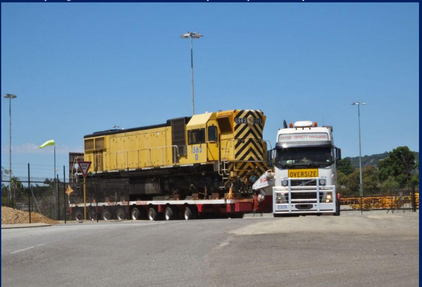
D1562 being hauled out hardstand area at Forrestfield January on 7th.