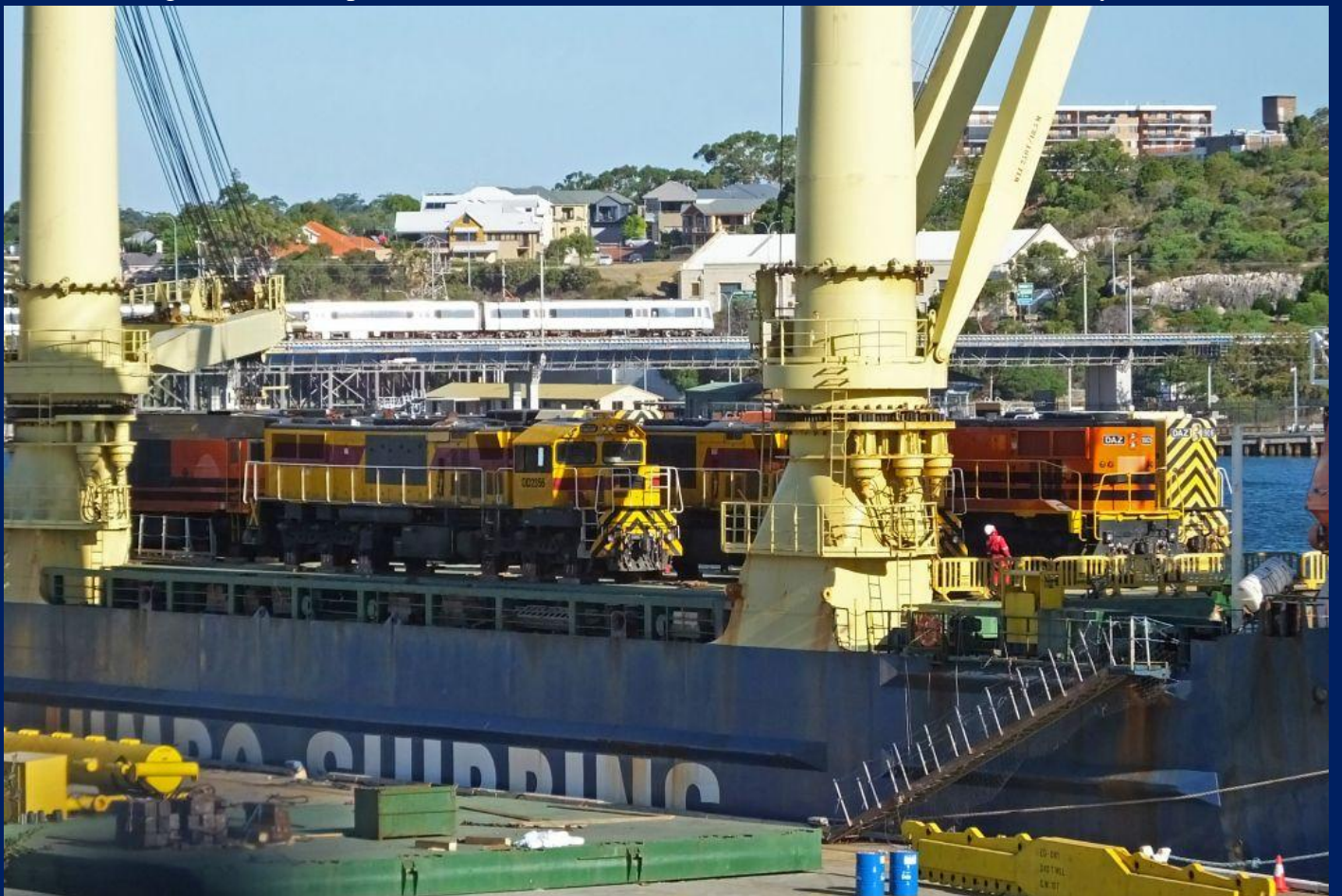
Locomotives as deck cargo on MV Fairlift awaiting chaining down and securing for voyage to South Africa.