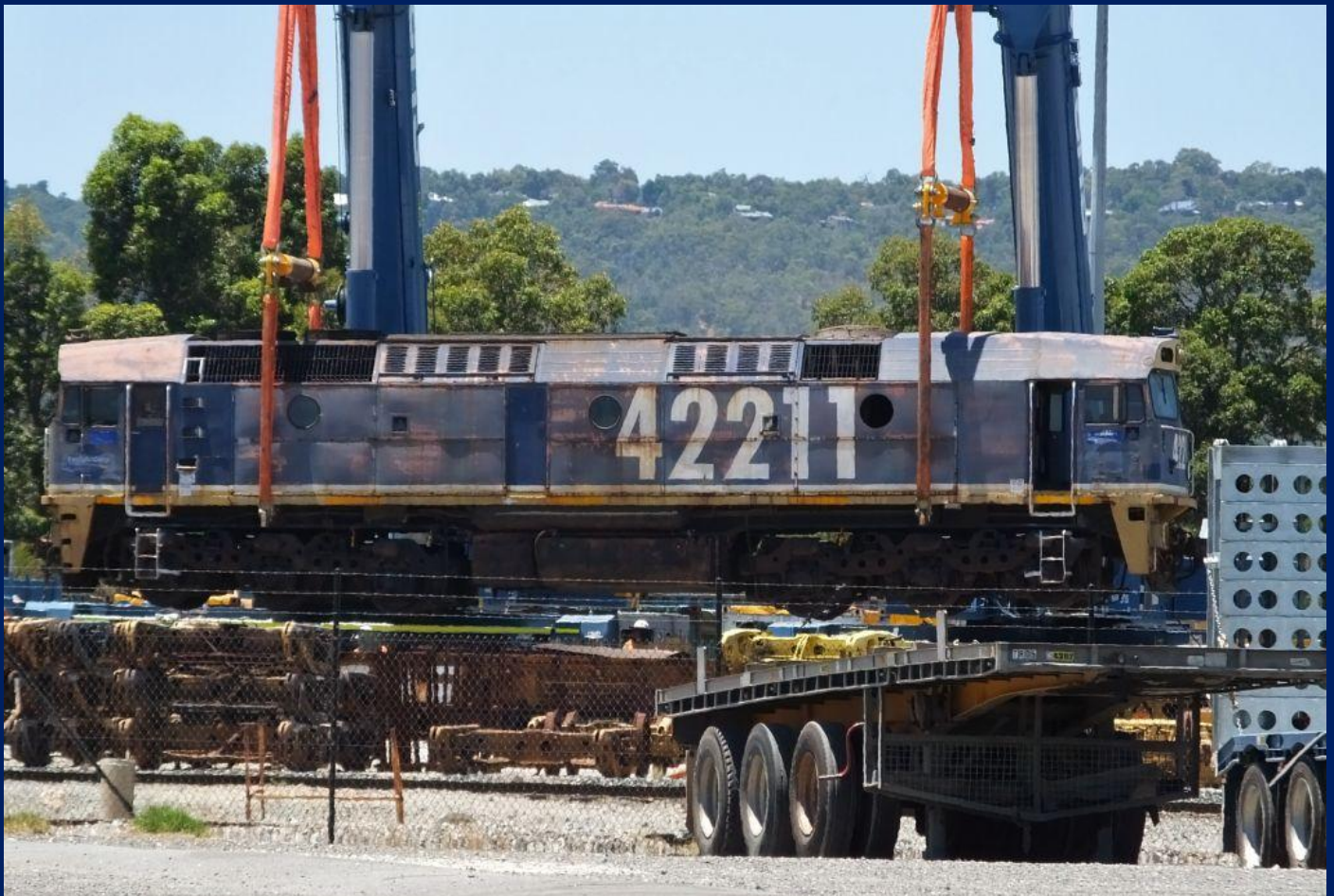
42111 being lifted onto transport float at Forrestfield for export January 4th.