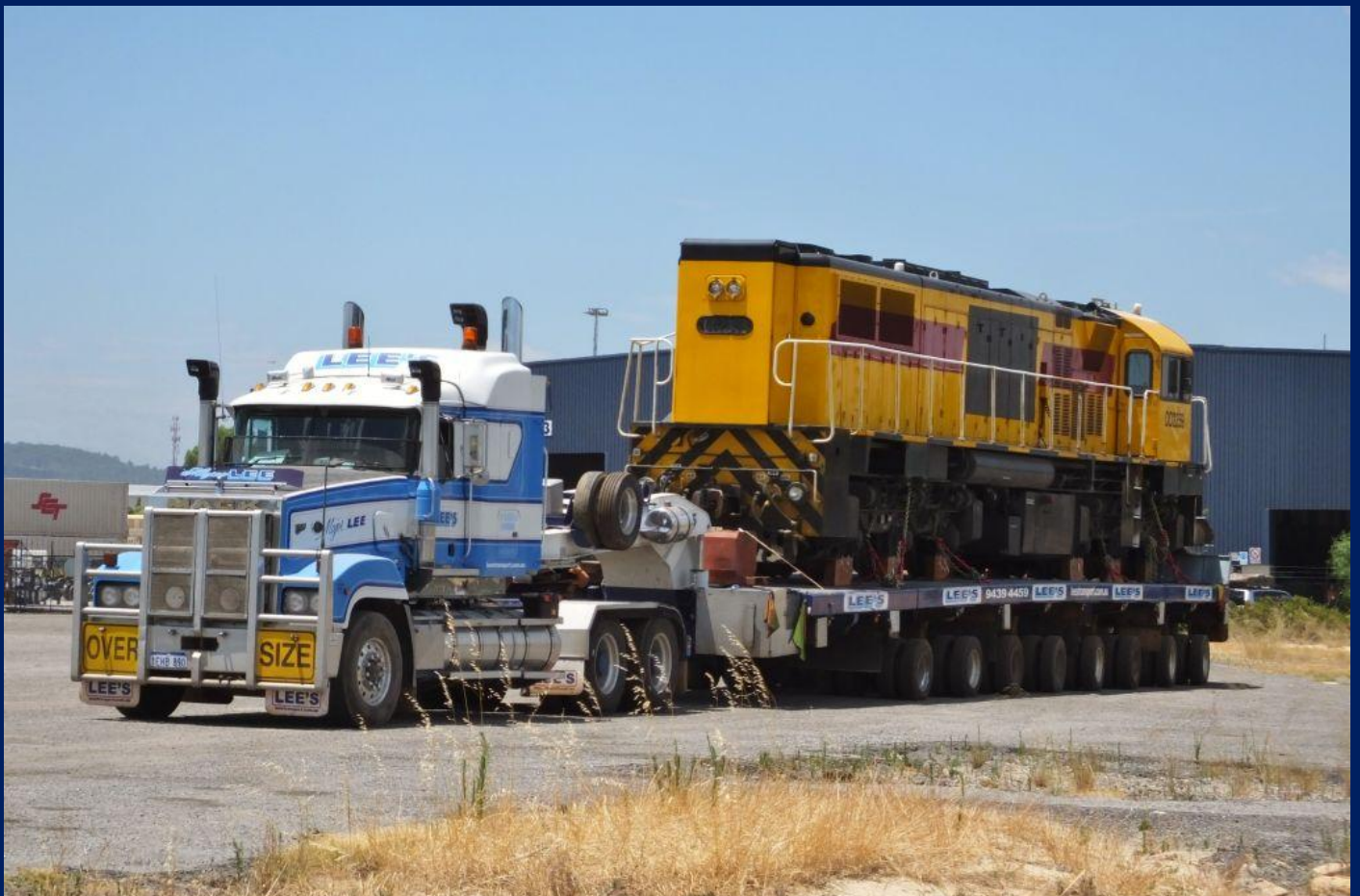
DD2359 on transport float parked up waiting for another locomotive to be loaded as run in twos 6/1.