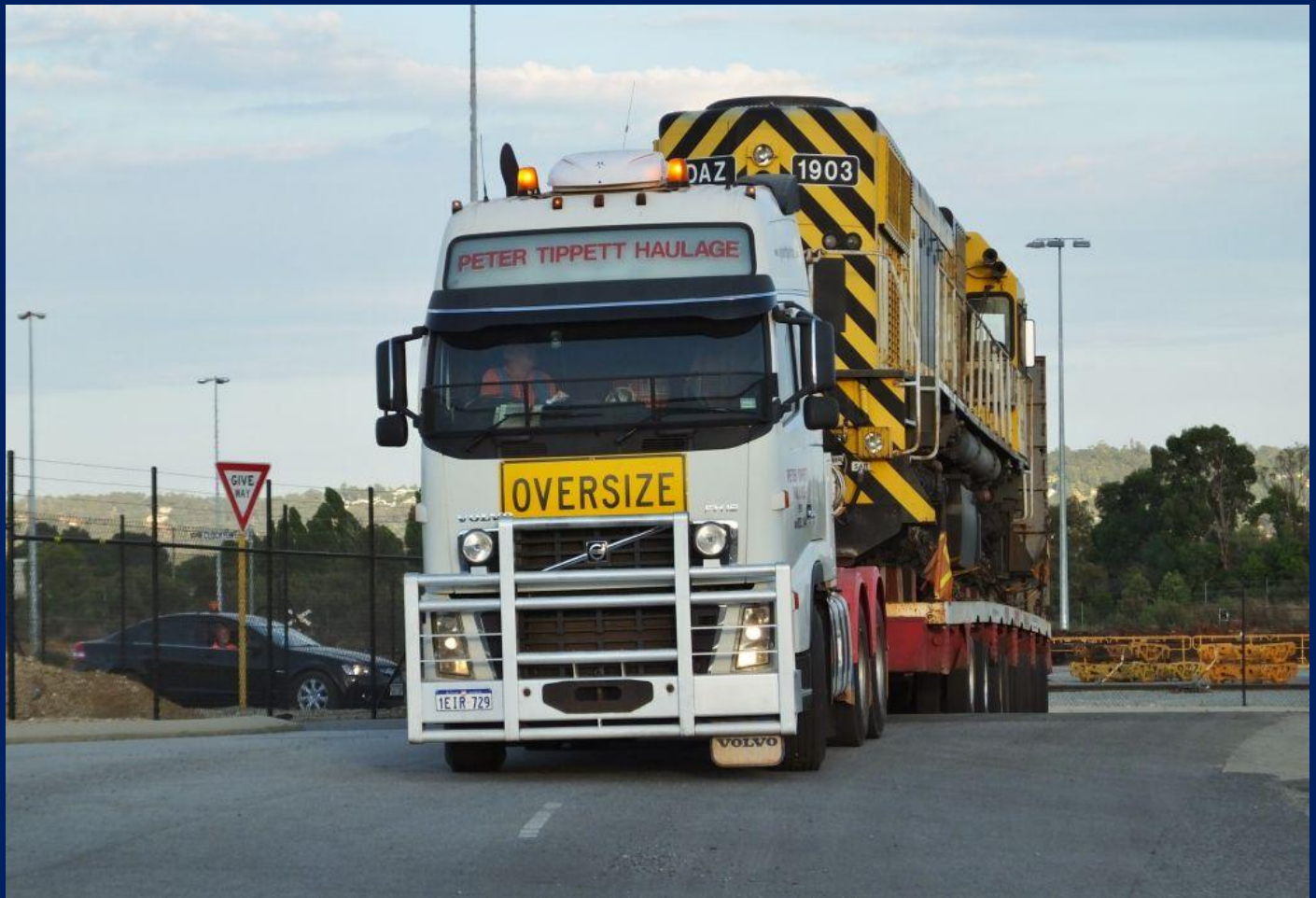
DAZ1903 being hauled from hardstand to parking lot Forrestfield January on 6th.