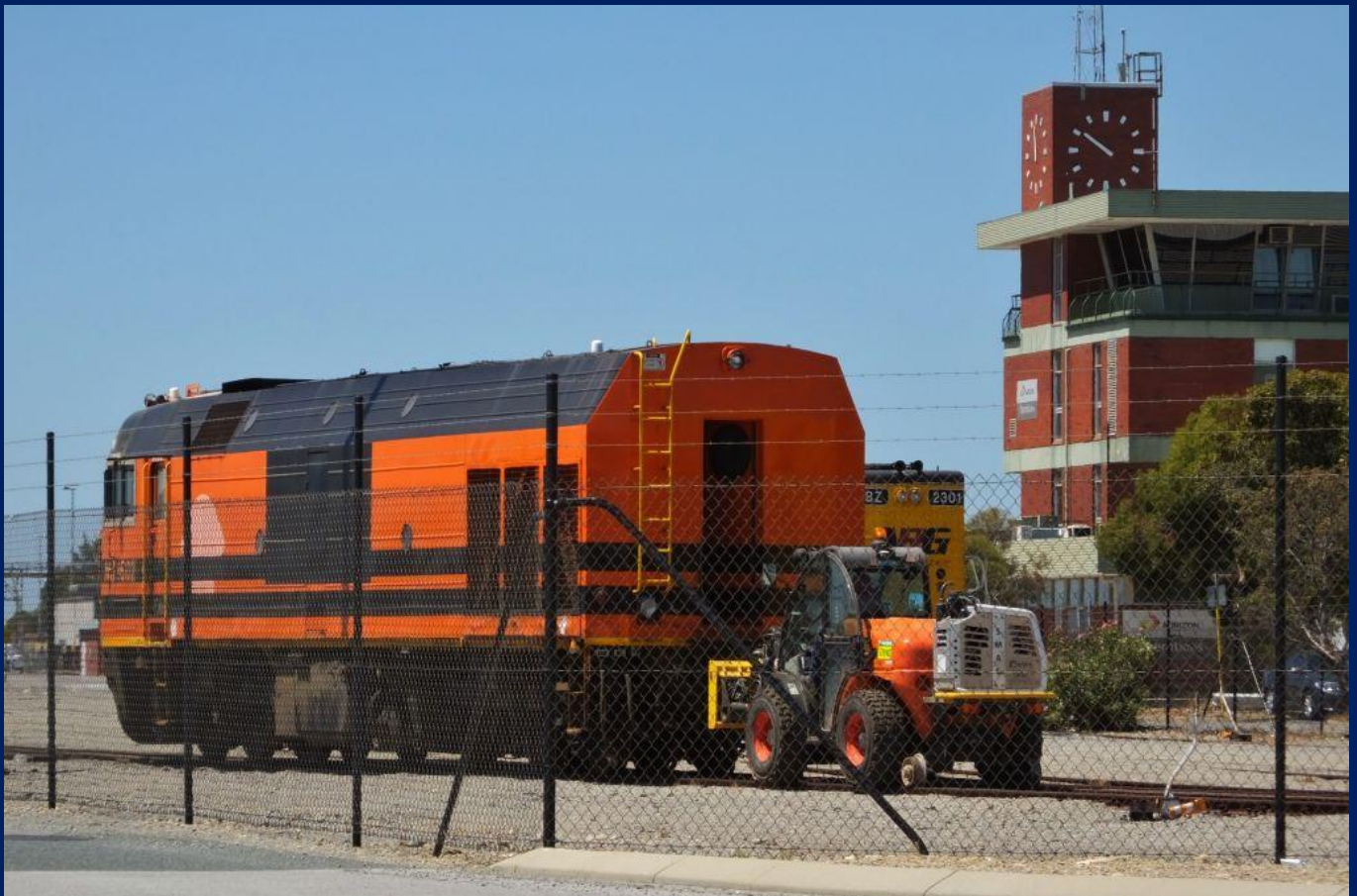
NJ1602 being pushed by shunting tractor into position for loading at narrow gauge loco January 7th.