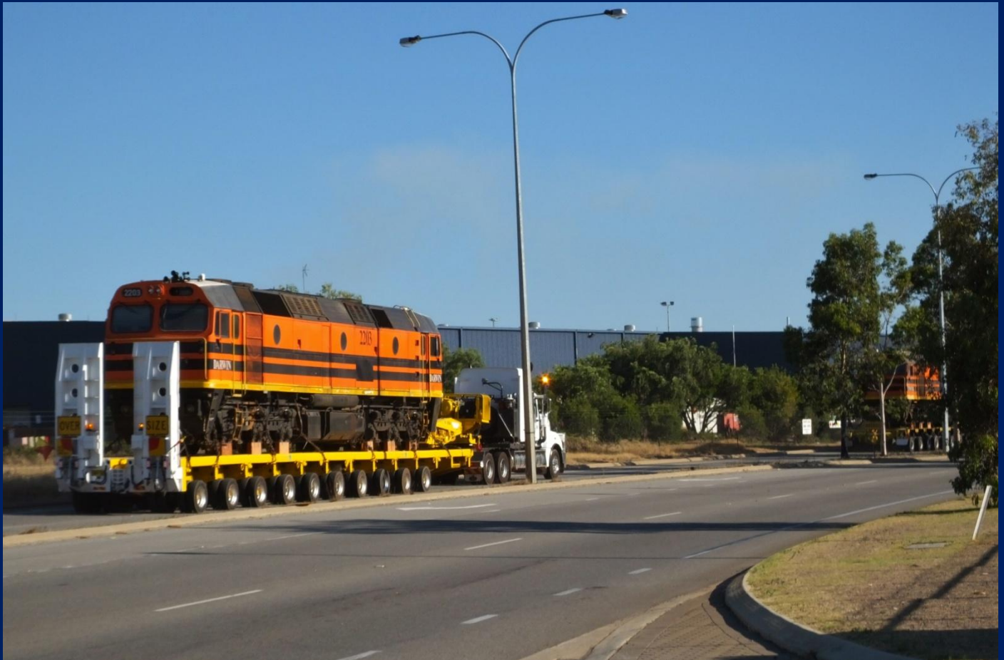
2201 & 2203 departing Forrestfield on heavy haul route to Fremantle port January 4th.