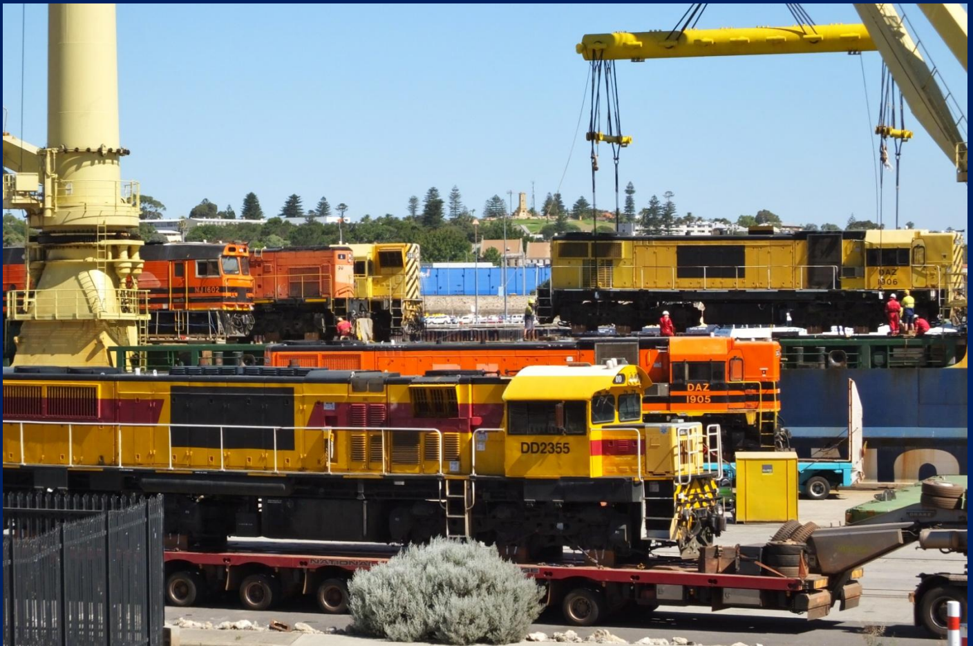
DD2355 & DAZ1905 on the wharf with DAZ1906 being lowered into position on the deck on 8/1.