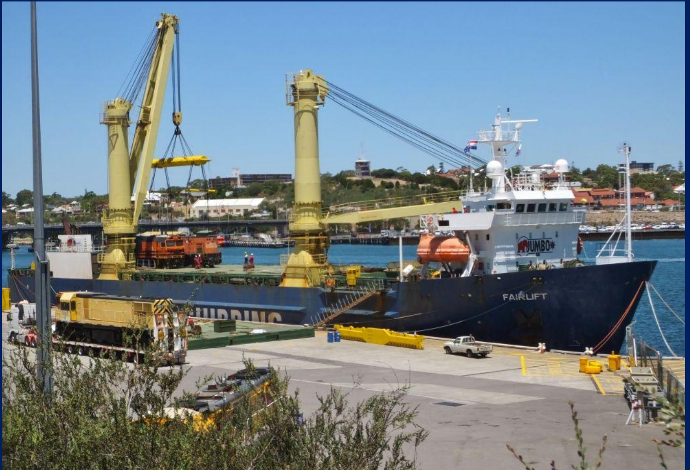
MV Fairlift with NJ1602 as deck cargo and A1202 being lowered alongside it at #11 North Wharf on 8/1.