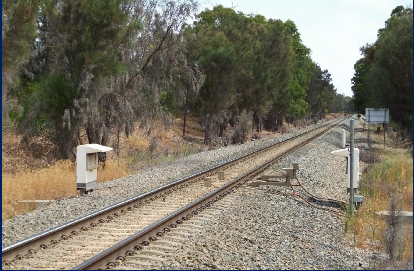
RailBam axle and bearing flaw detector south of Mundijong from the north side on 24th January.