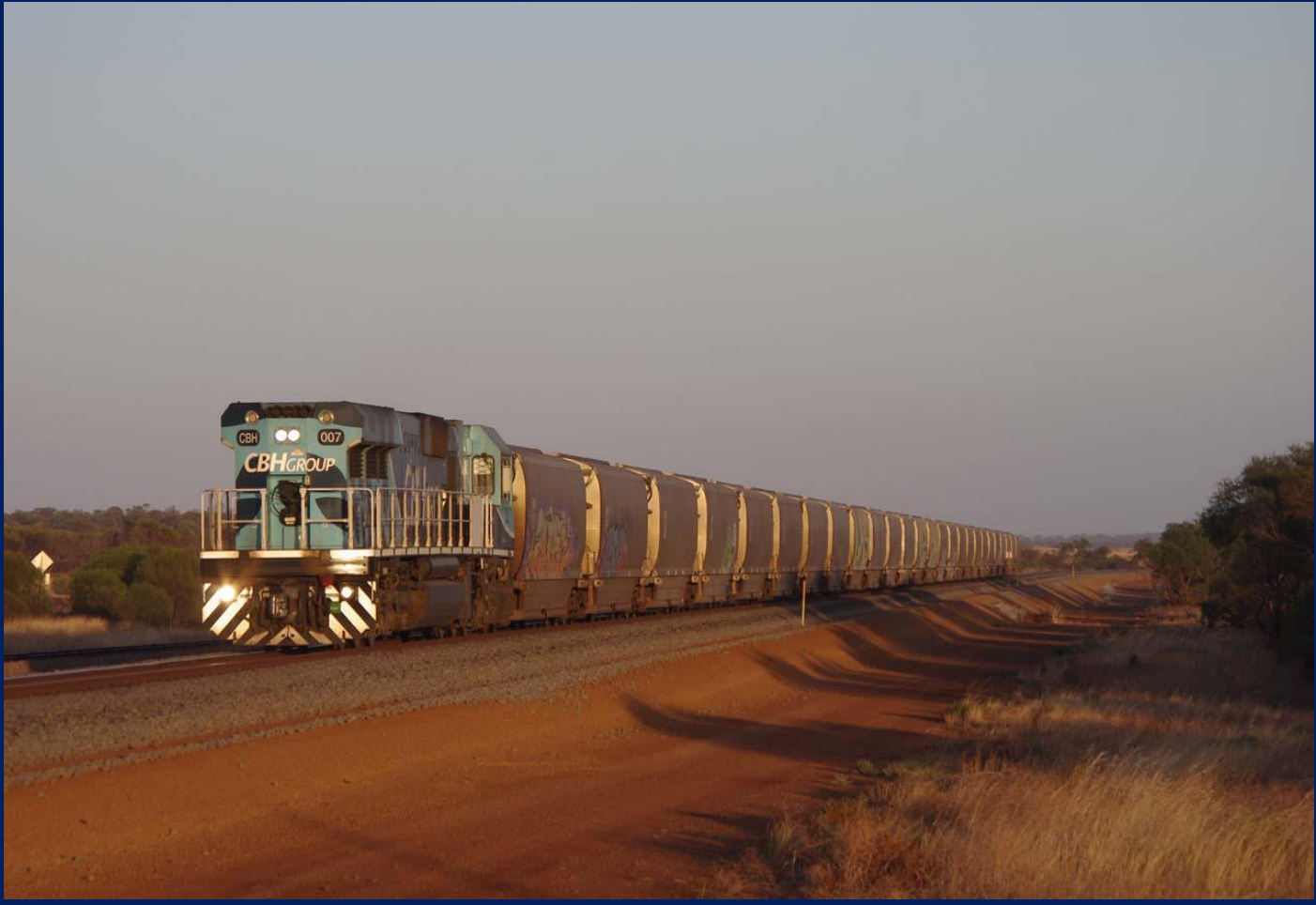
CBH007 on 5G50 empty Watco grain at Monger January 15th.