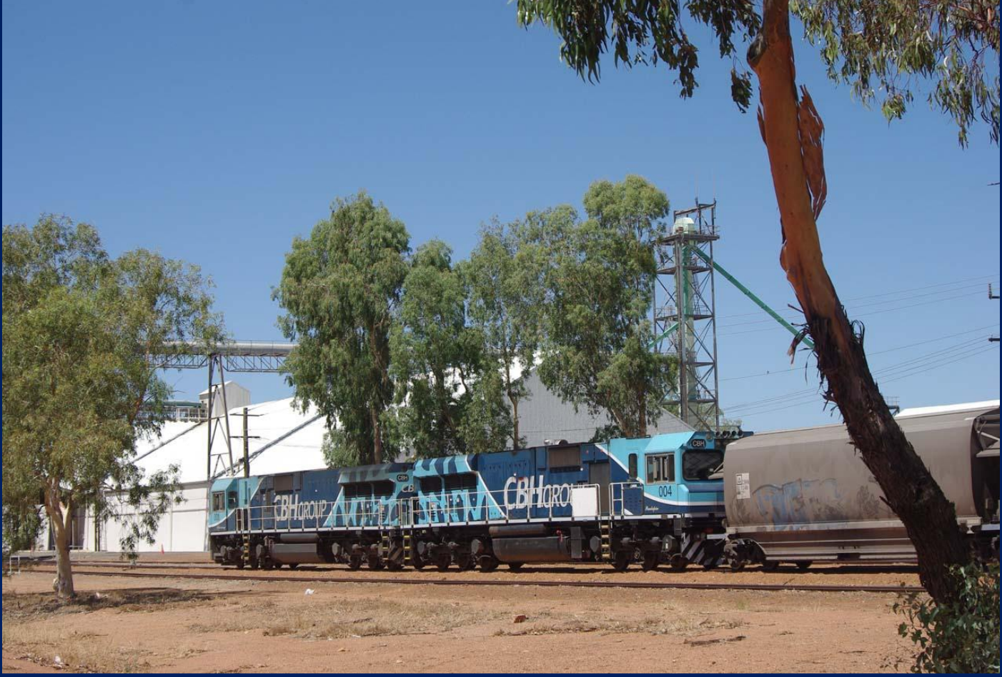
CBH001 & CBH004 on 4G50 Watco grain at Morawa CBH January 14th.