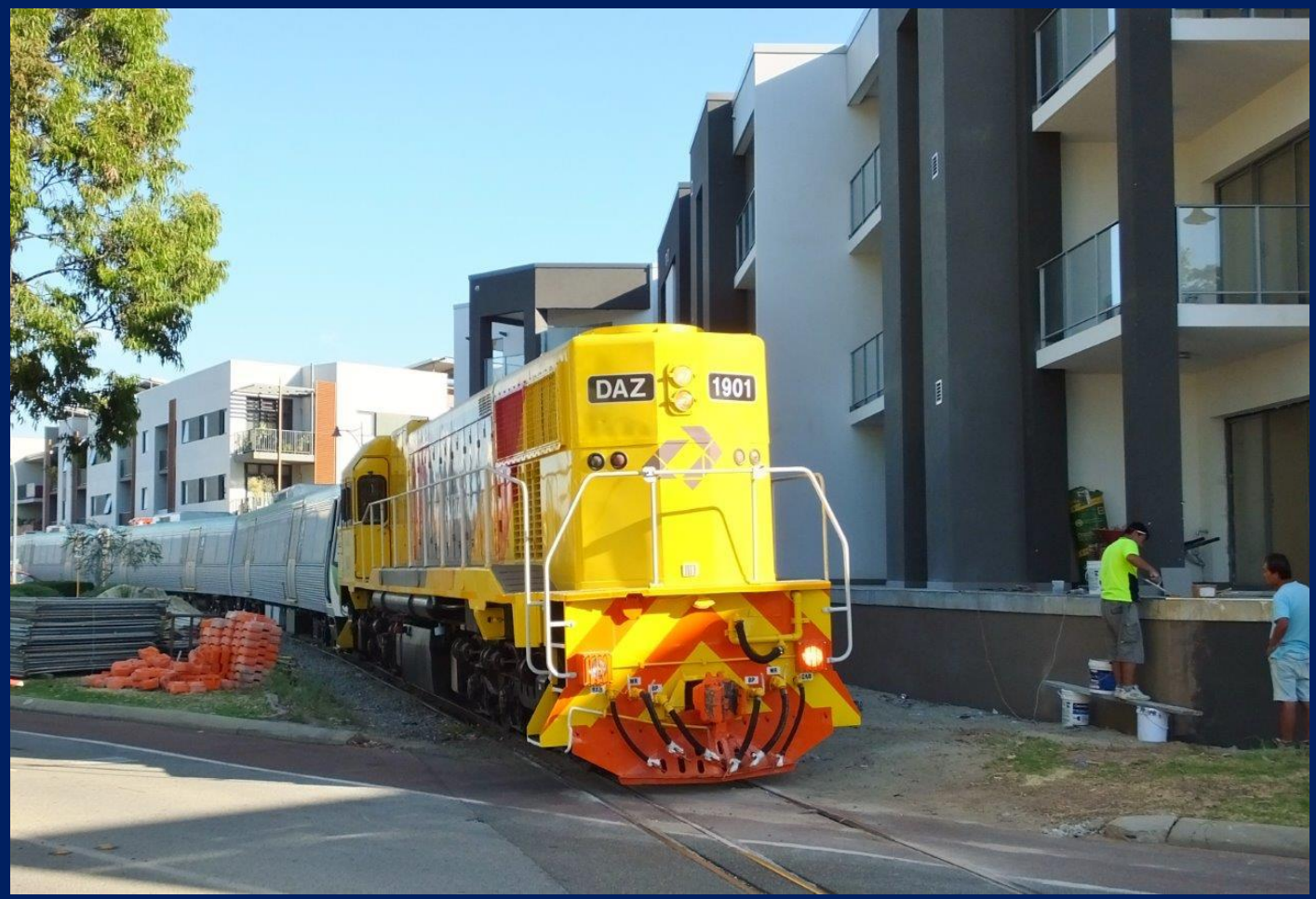
DAZ1901 hauls EMU set #103 out of old workshops past nearly completed apartments 23/1.