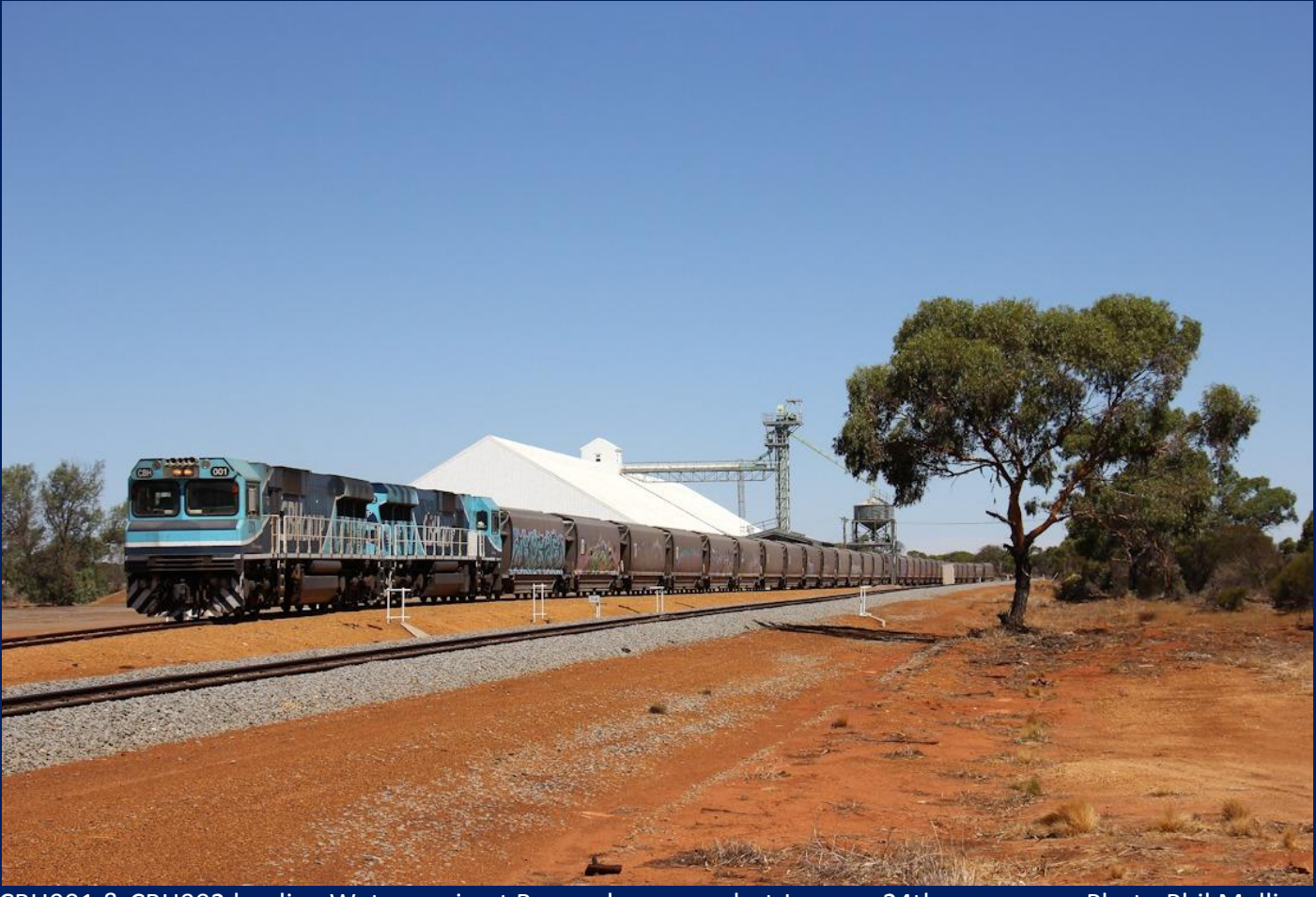
CBH001 & CBH002 loading Watco grain at Bowgada on very hot January 24th.