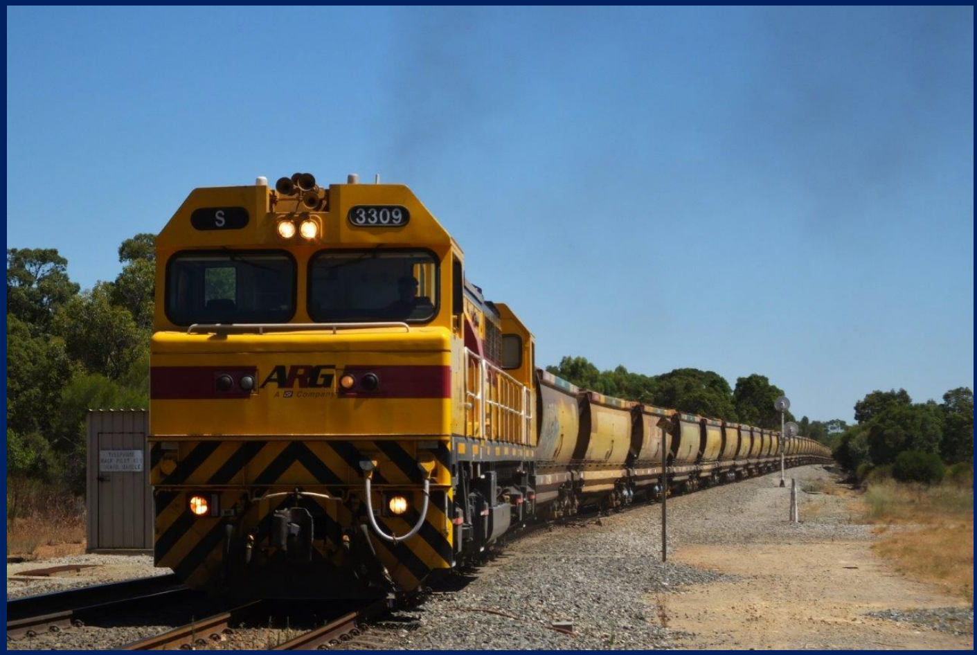
S3309 on 1962 bauxite entering loop Mundijong loop to cross 1233 on January 25th.