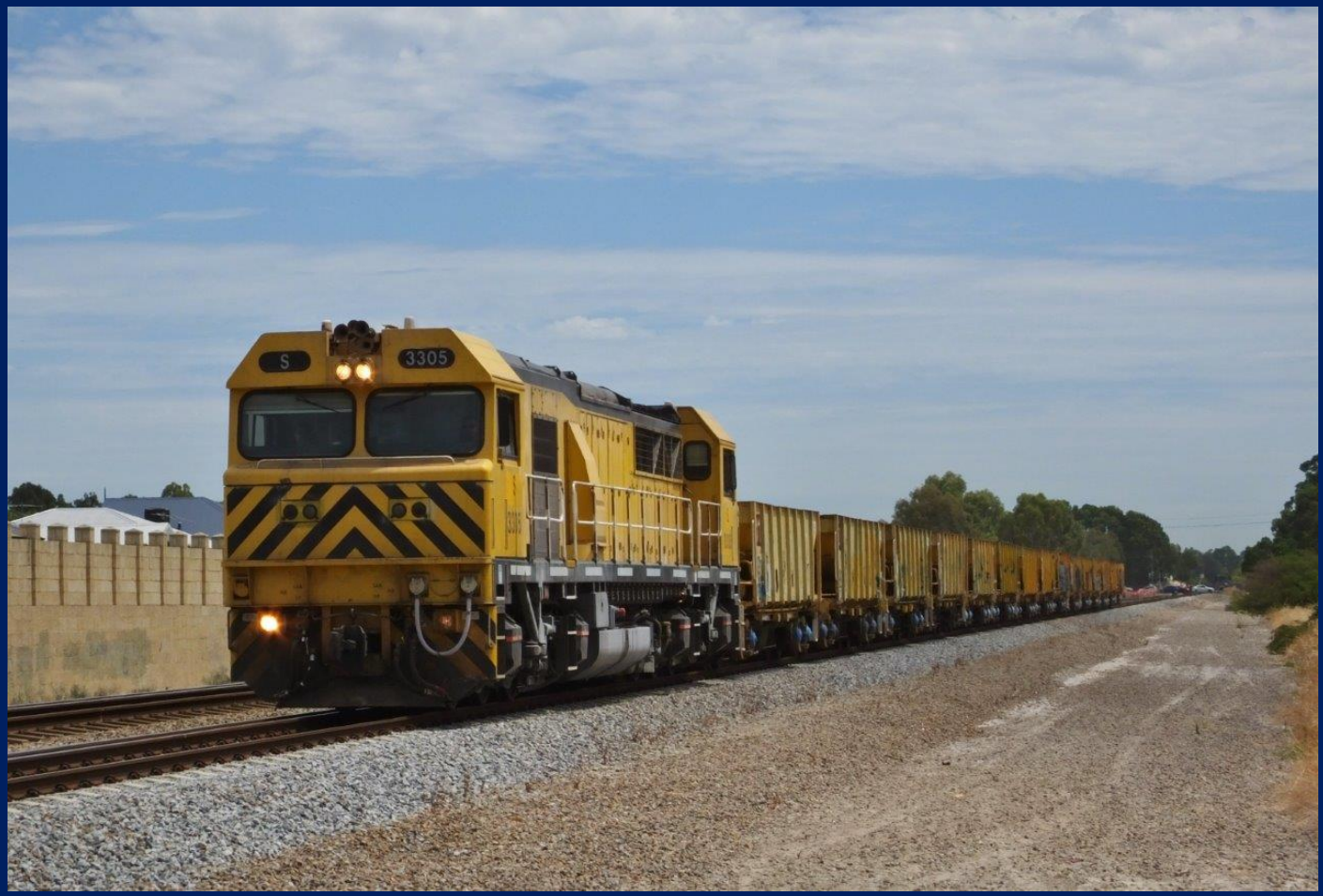
S3305 on 4120 empty ballast train at Thornlie January 21st.