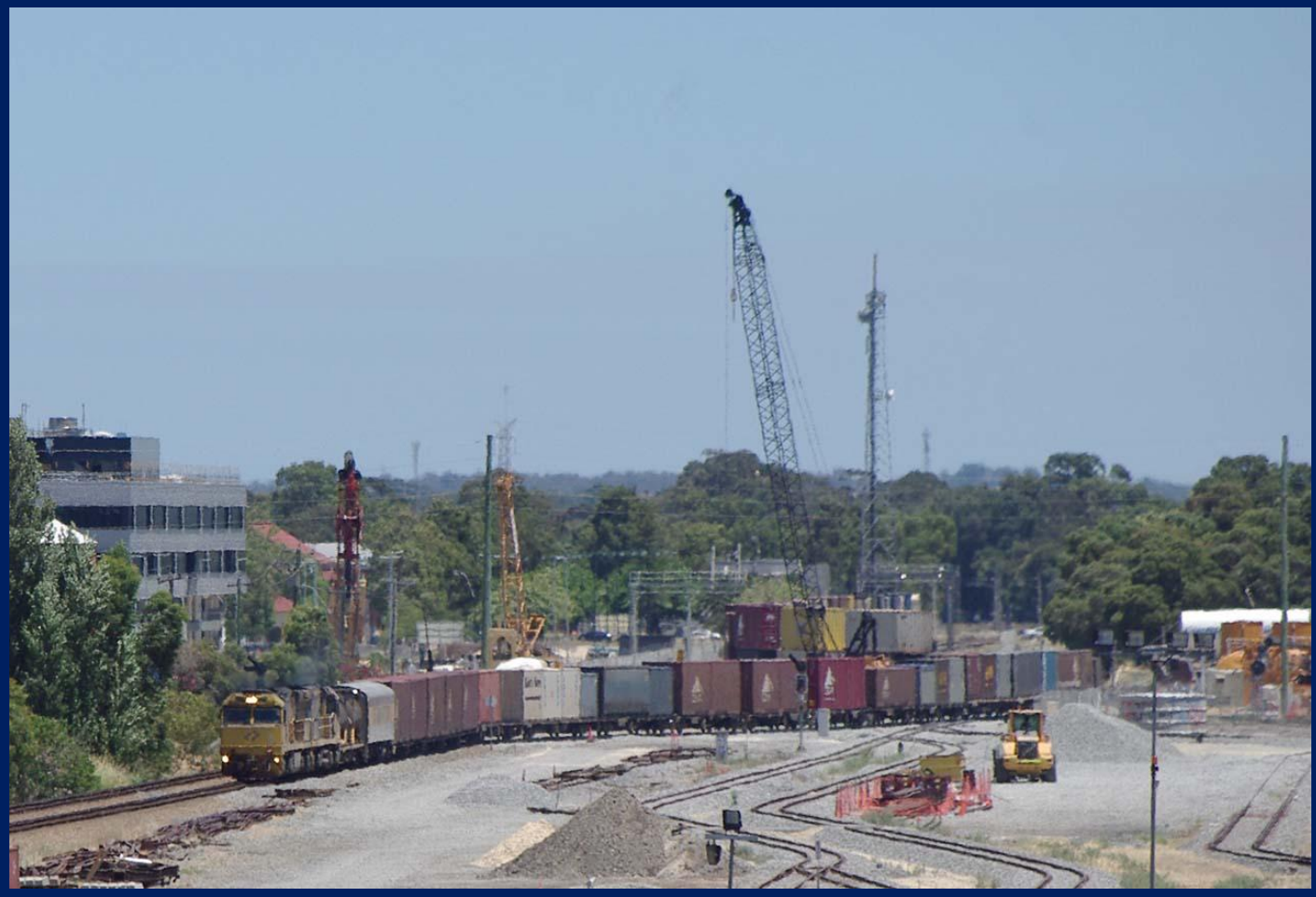
6021 & 6008 on 7PM1 running thru Midland deviation part of Lloyd Street grade separation 10/1.