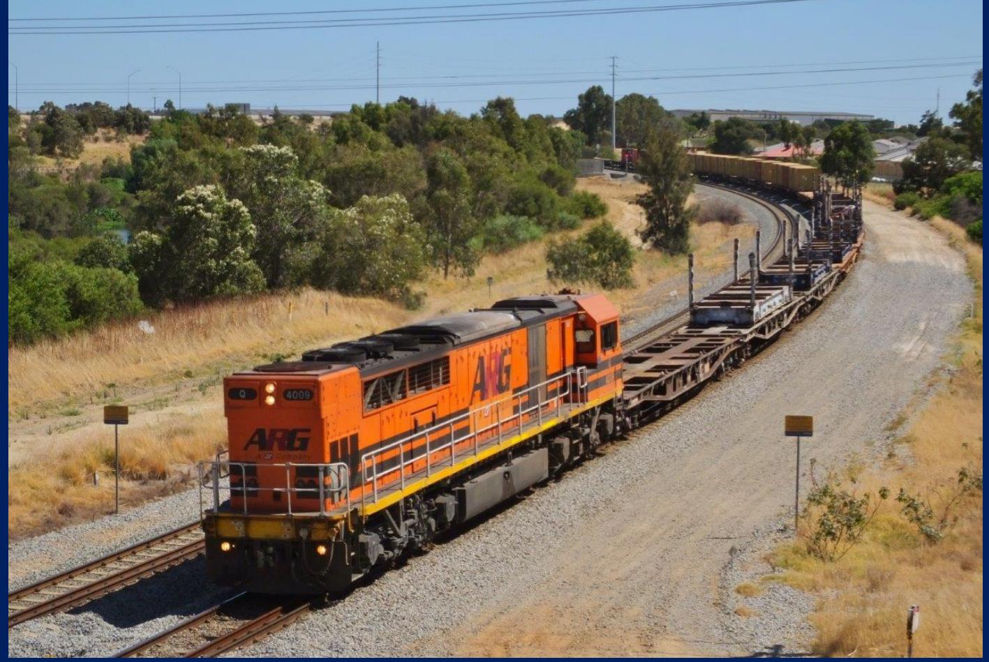
Q4009 on 1196 lead container train with gas pipe containers to North Port at Wattle Grove January 25th.