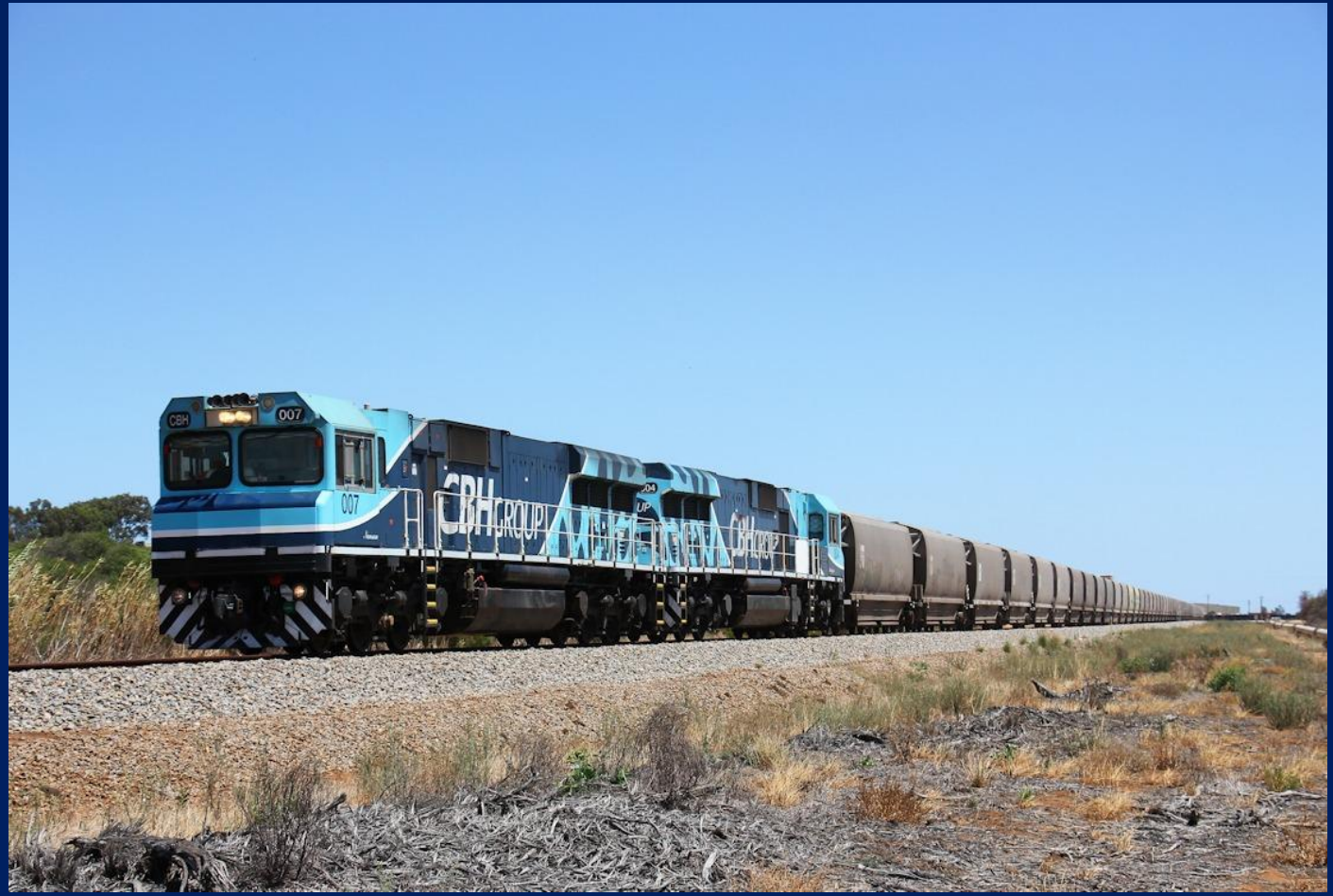
CBH007 & CBH004 on empty Watco grain to Mingenew at Narngulu South January 26th.