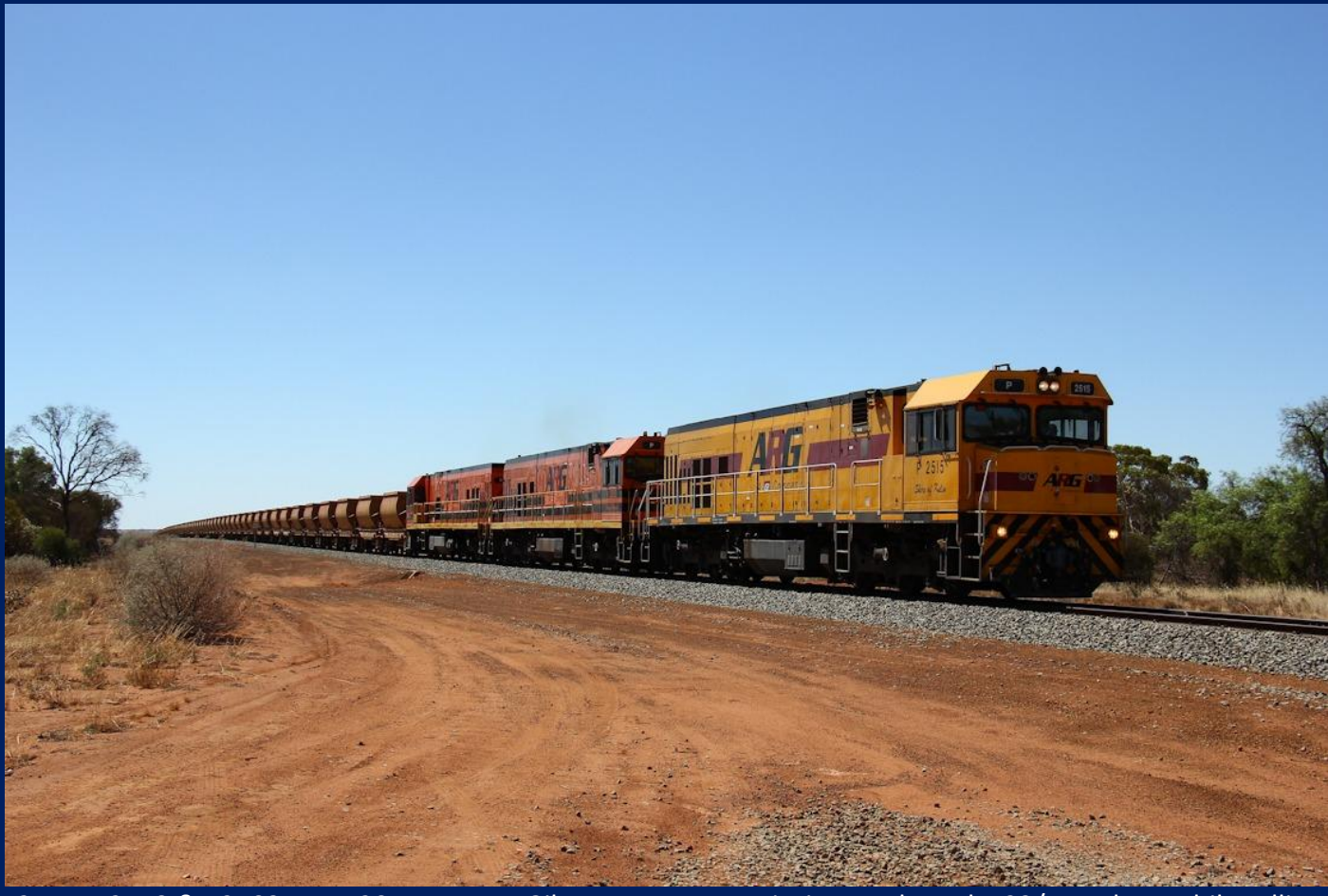
P2515, P2513 & P2503 on 7720 empty Mt Gibson ore to Perenjori at Koolanooka 23/1.