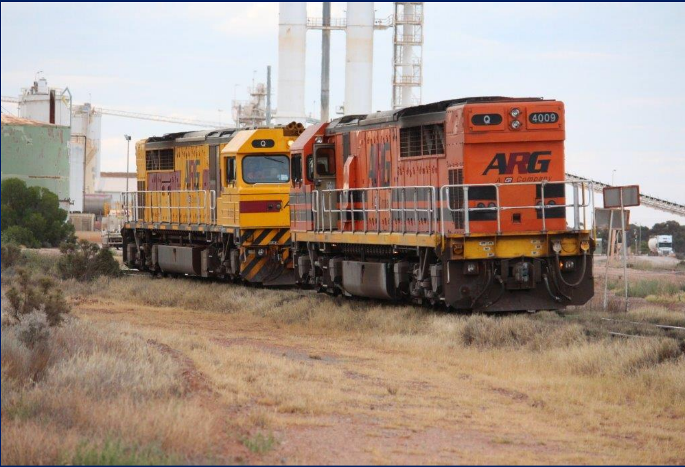
Failed Q4009 on 7C73 at Parkeston being rescued by Q4016 on 4LE1 January 24th.