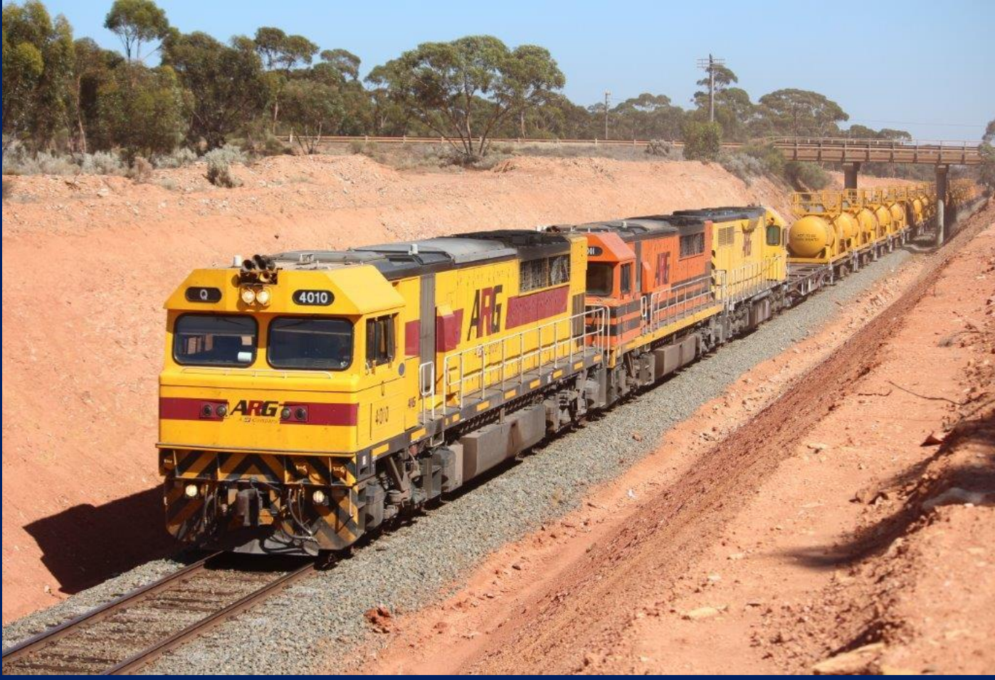
Q4010, Q4001 & L3115 on 7405 empty acid tankers to Hampton January 24th. Ph