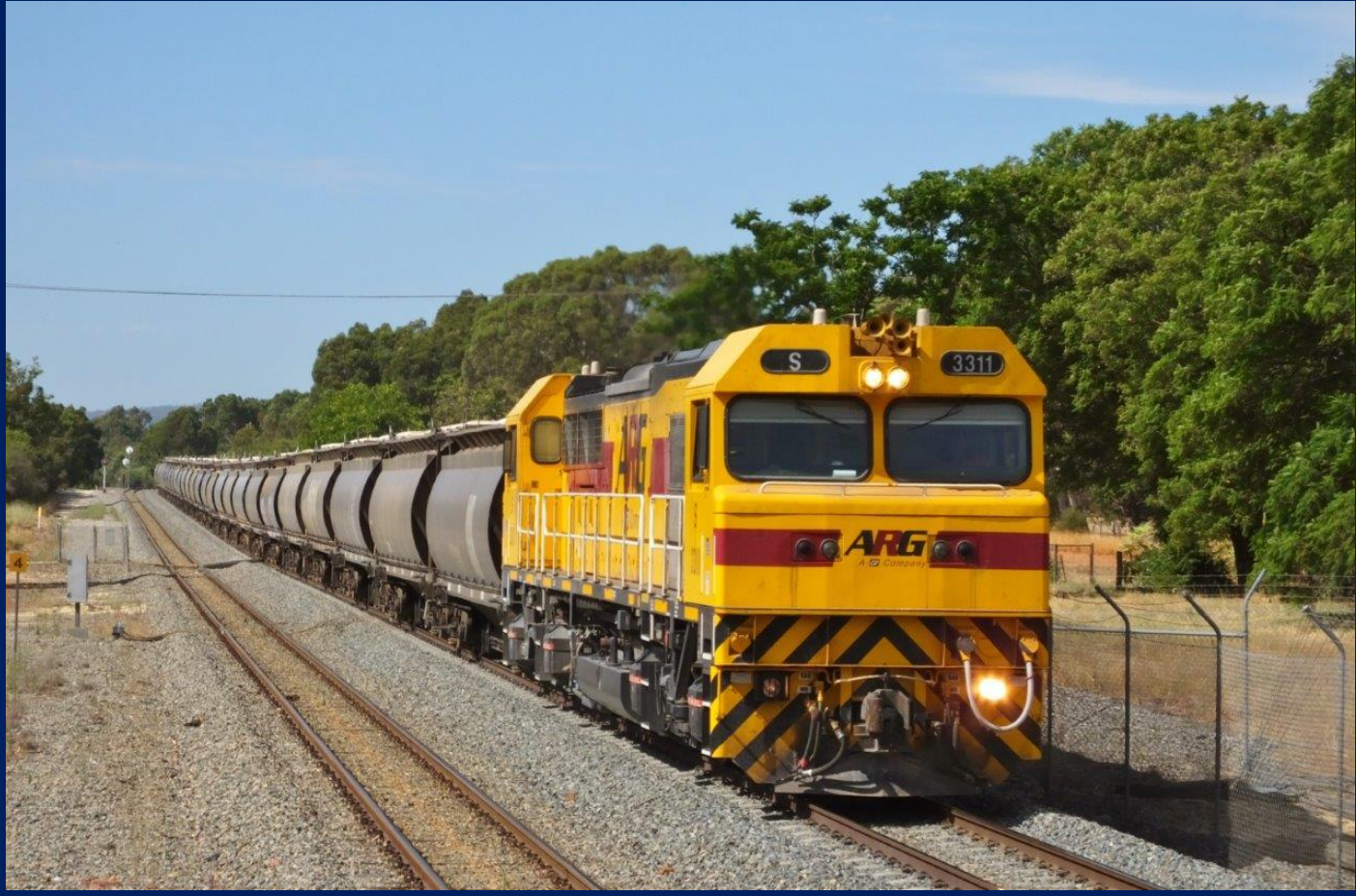
S3111 on 7233 empty alumina to Calcine at Mundijong January 24th.