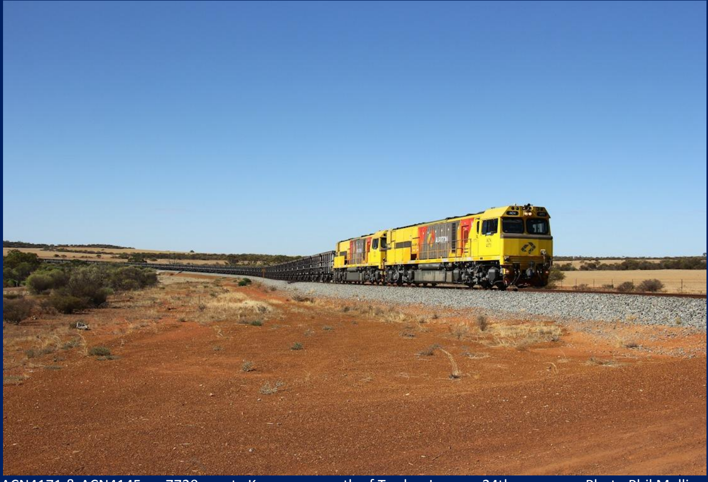
ACN4171 & ACN4145 on 7720 empty Karara ore south of Tardun January 24th.