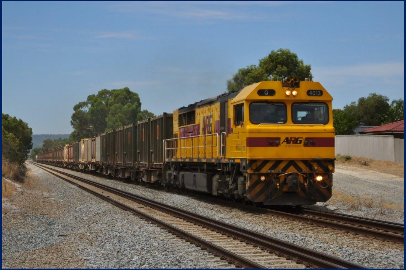
Q4013 on 3430 empty sulphur at Thornlie January 21st.