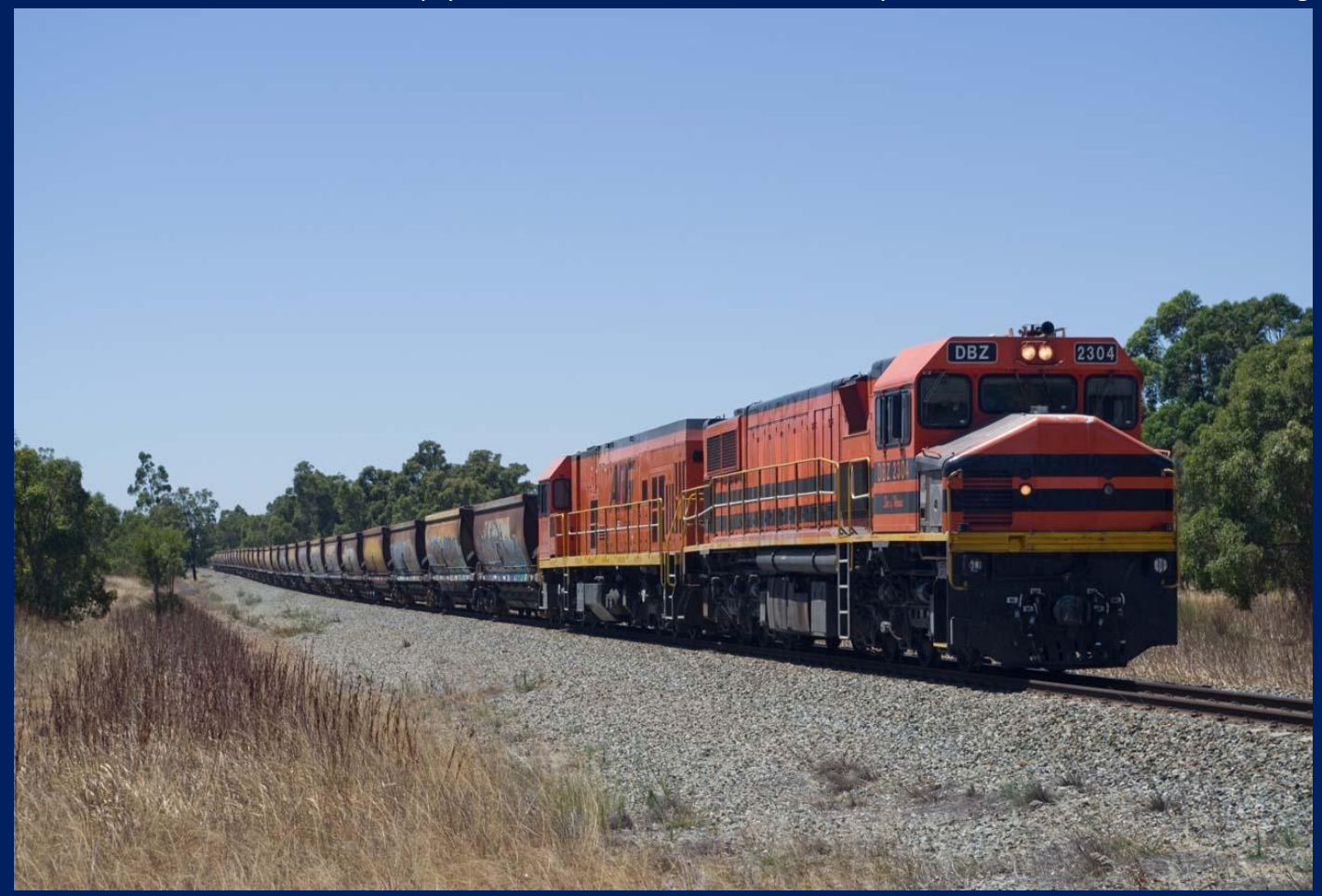
DBZ2304 & P2516 on 1267 empty coal at Keysbrook January 25th.