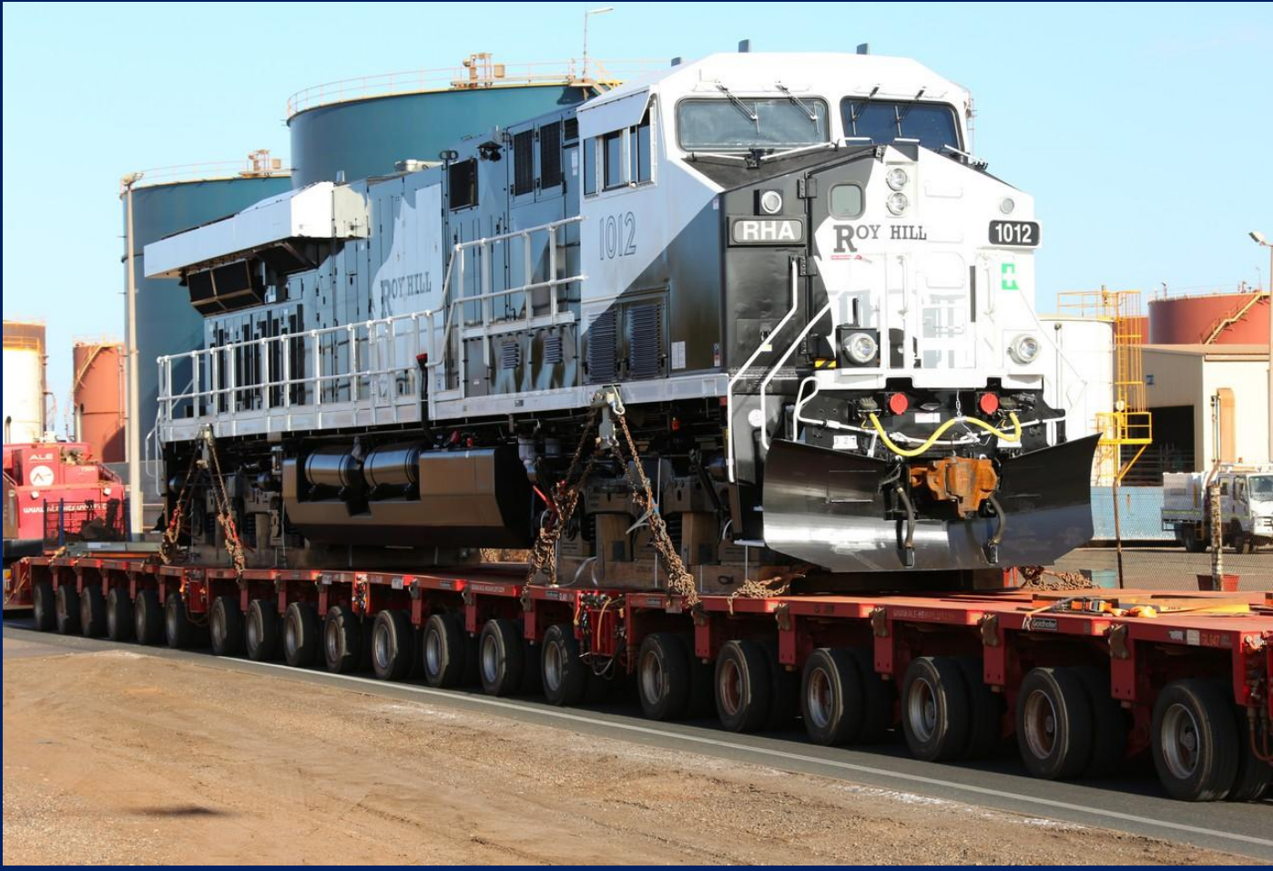
RHA1012 Roy Hill General Electric ES44ACi at Port Hedland January 29th.