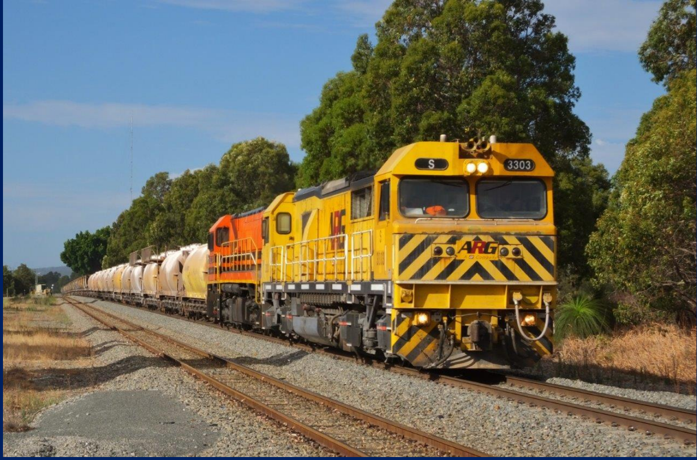
S3303 & DBZ2304 on 7271 lime and empty coal at Mundijong January 24th.