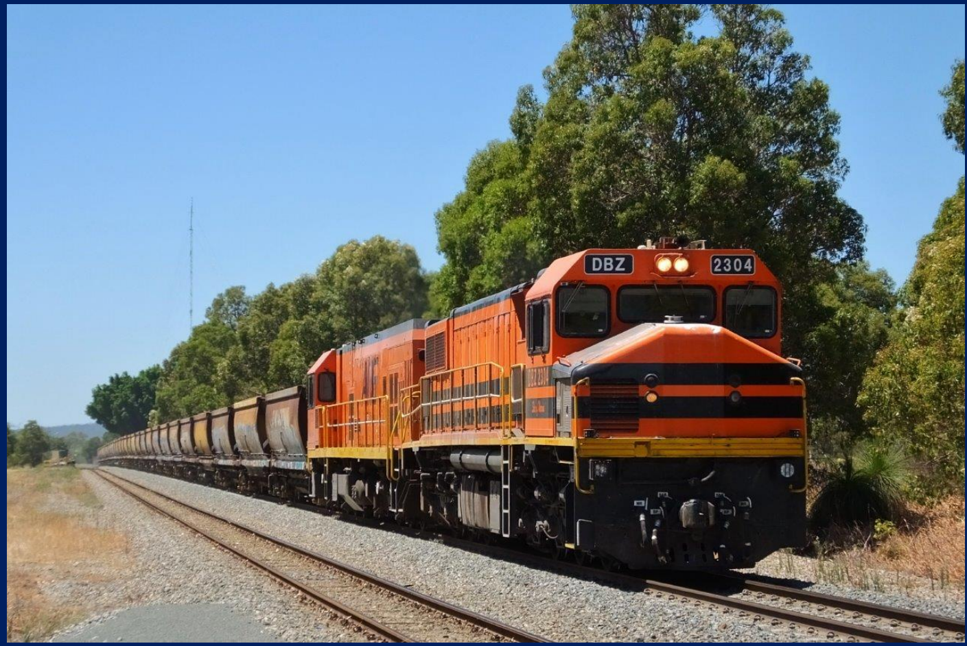
DBZ2304 & P2516 on 1267 empty coal at Mundijong January 25th.