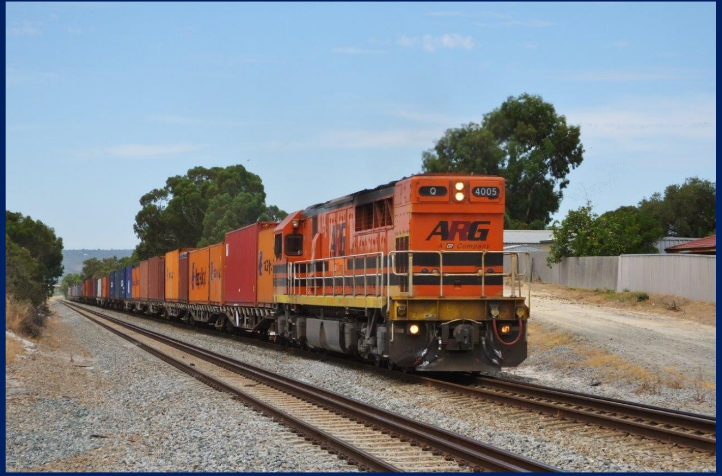
Q4005 on 4144 container train at Thornlie January 21st.