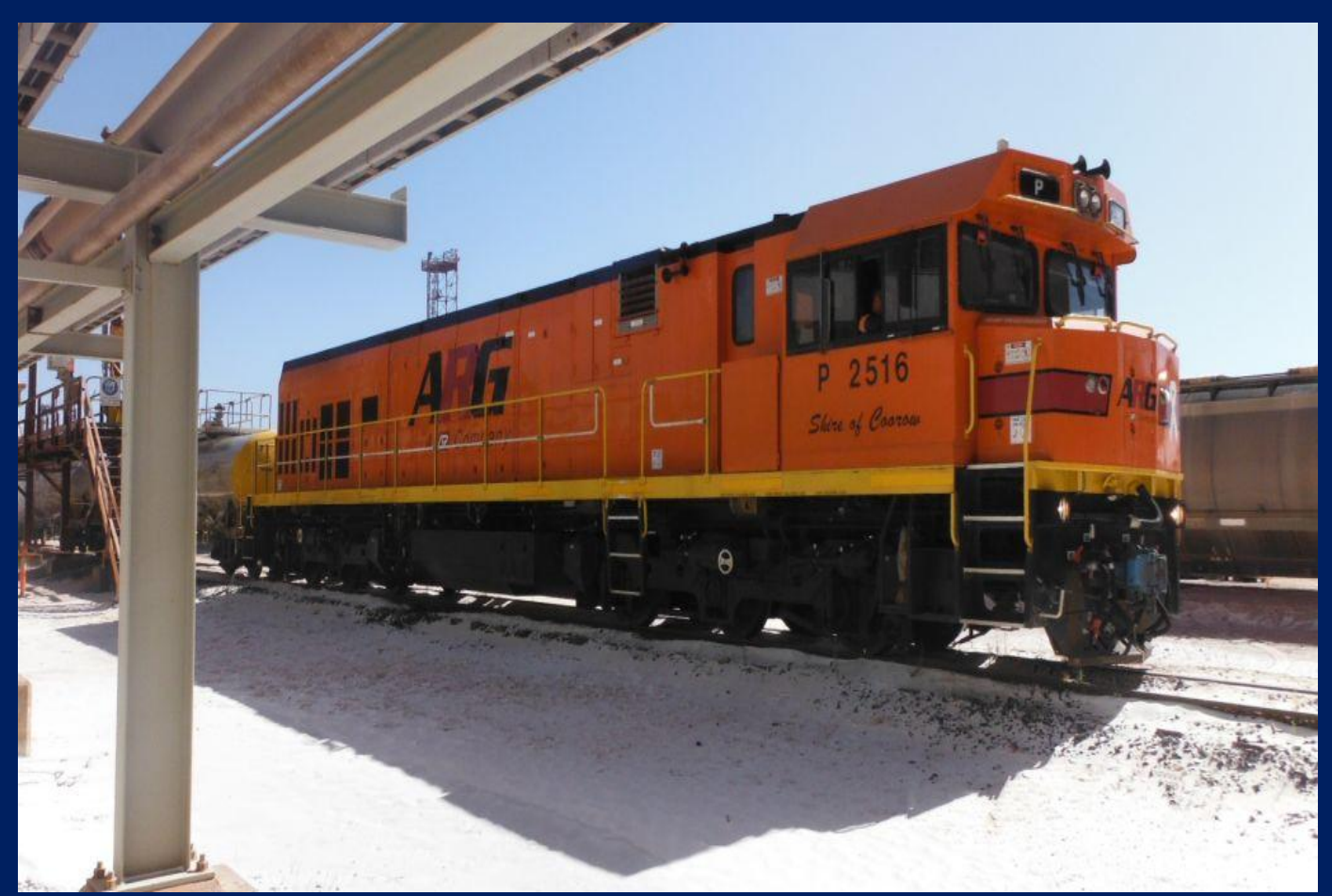
P2516 unloading caustic tankers at Worsley Refinery Hamilton March 20th.