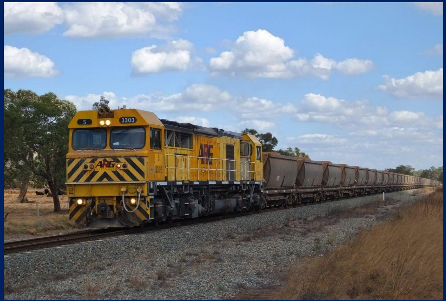
S3303 on 3962 bauxite to Kwinana at Keysbrook March 3rd.