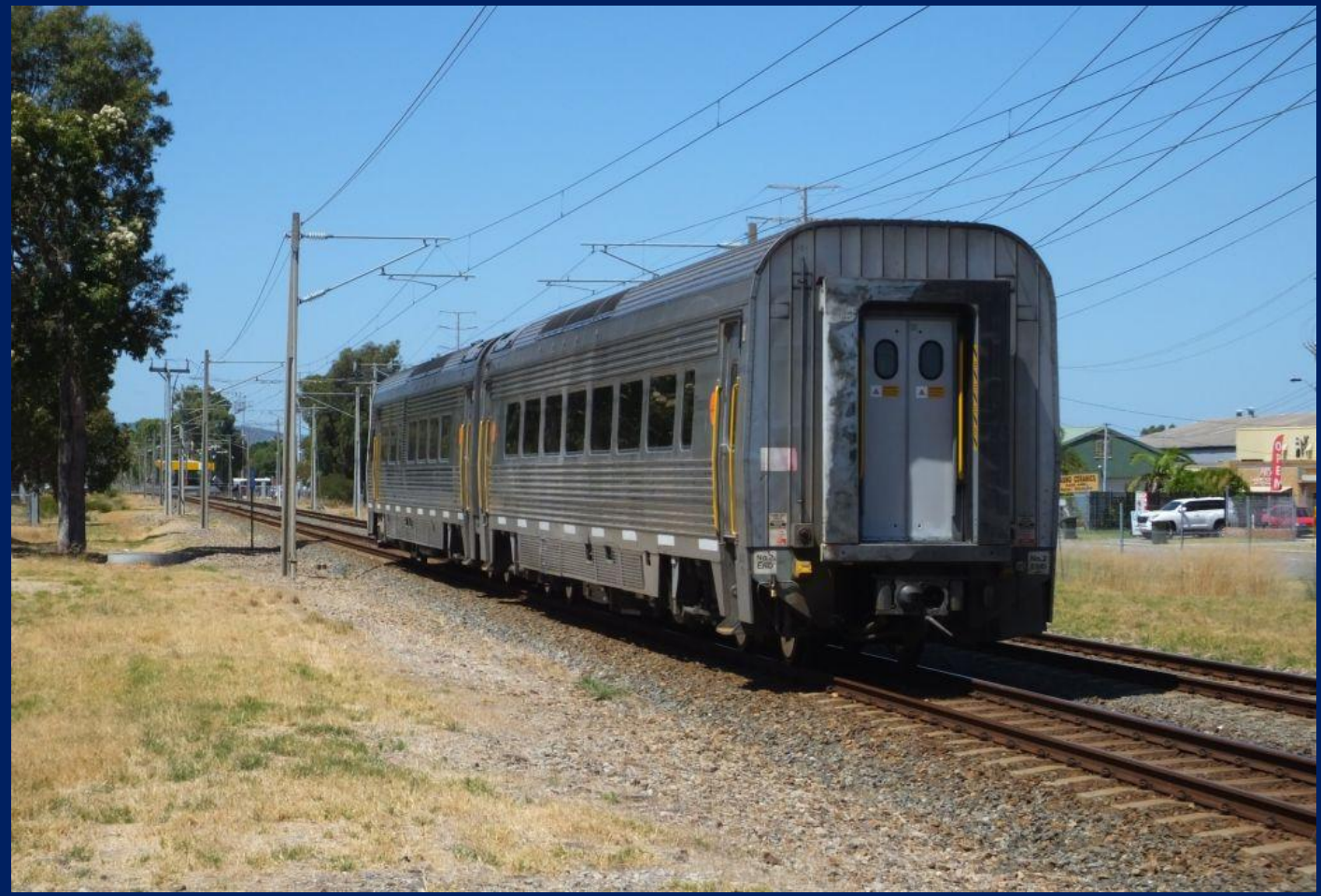
ADQ121 works trial with ADP101 Claisebrook to Armadale at Cannington on 4/3.