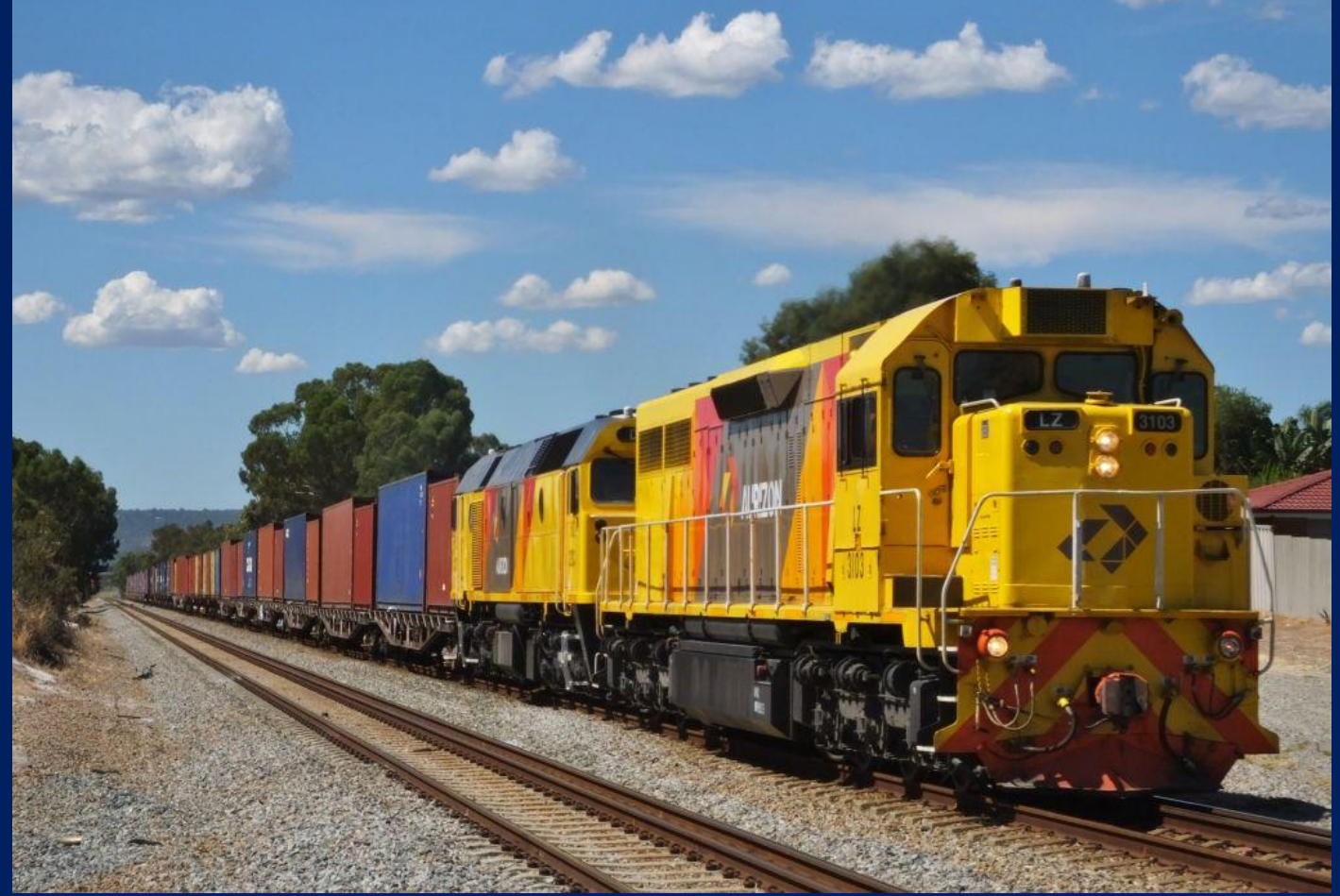
LZ3103 & DC2213 on 2144 ILS container train at Thornlie on one of LZ3103s last runs 9/3.