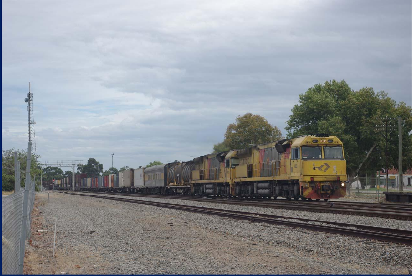
6023 & 6025 on 7PM1 Aurizon intermodal at Midland March 14th.