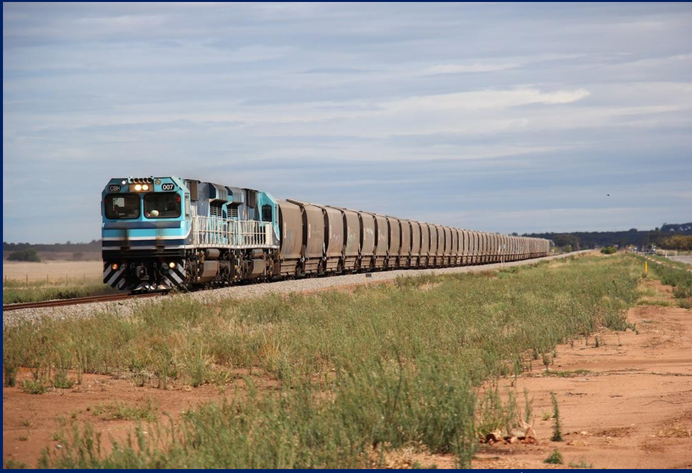
CBH007 & CBH008 on empty Watco grain heading thru Georgina to Mingenew 7/3.