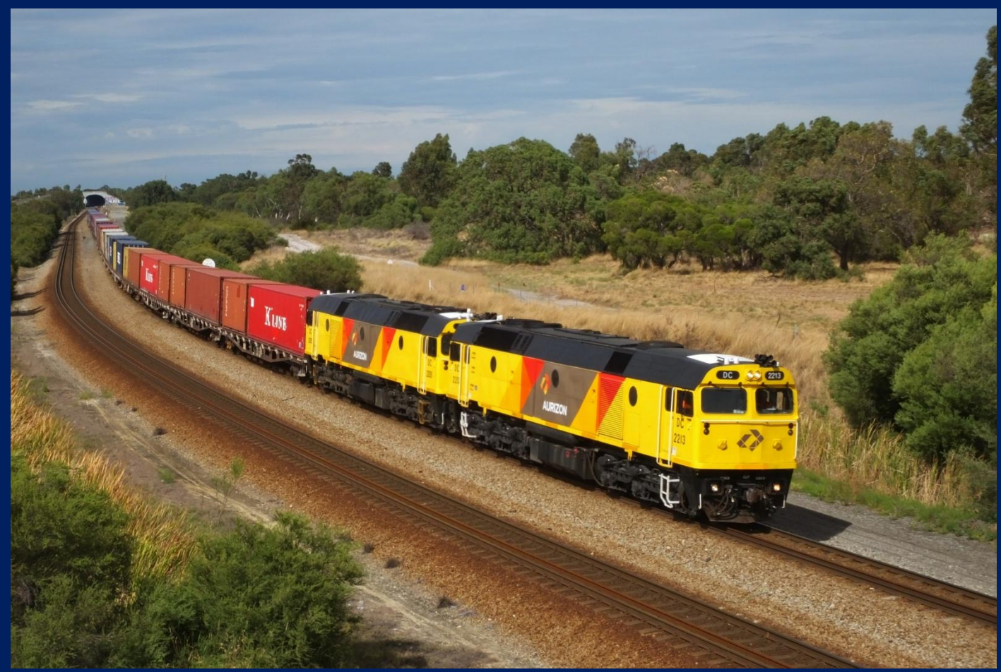
DAZ2213 & DAZ2205 on 7161 special movement to Jumperkine at South Guildford 14/3.