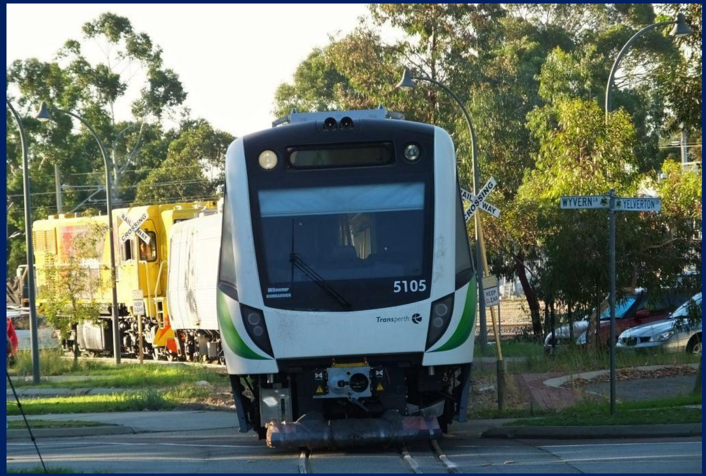
New EMU set 105 being hauled thru car park at Midland after leaving old workshops 6/3.