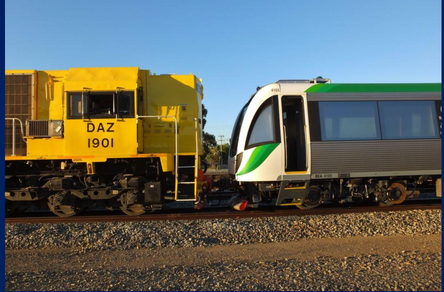
Nose to nose DAZ1901 and EMU BEA4105 in dual gauge loop Midland March 6th.