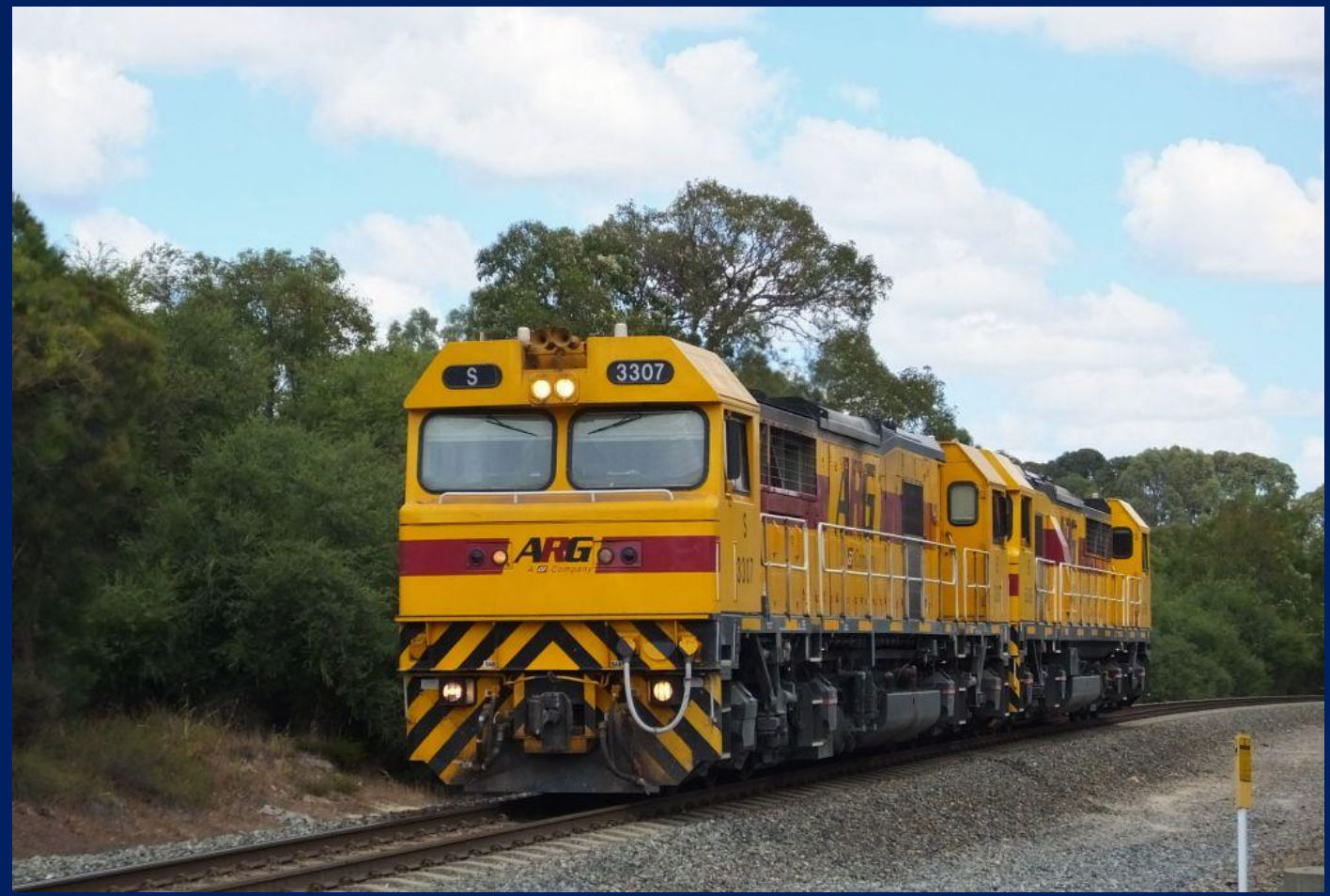
S3307 & S3308 on 3124 light engine to Kwinana at Mundijong March 3rd.