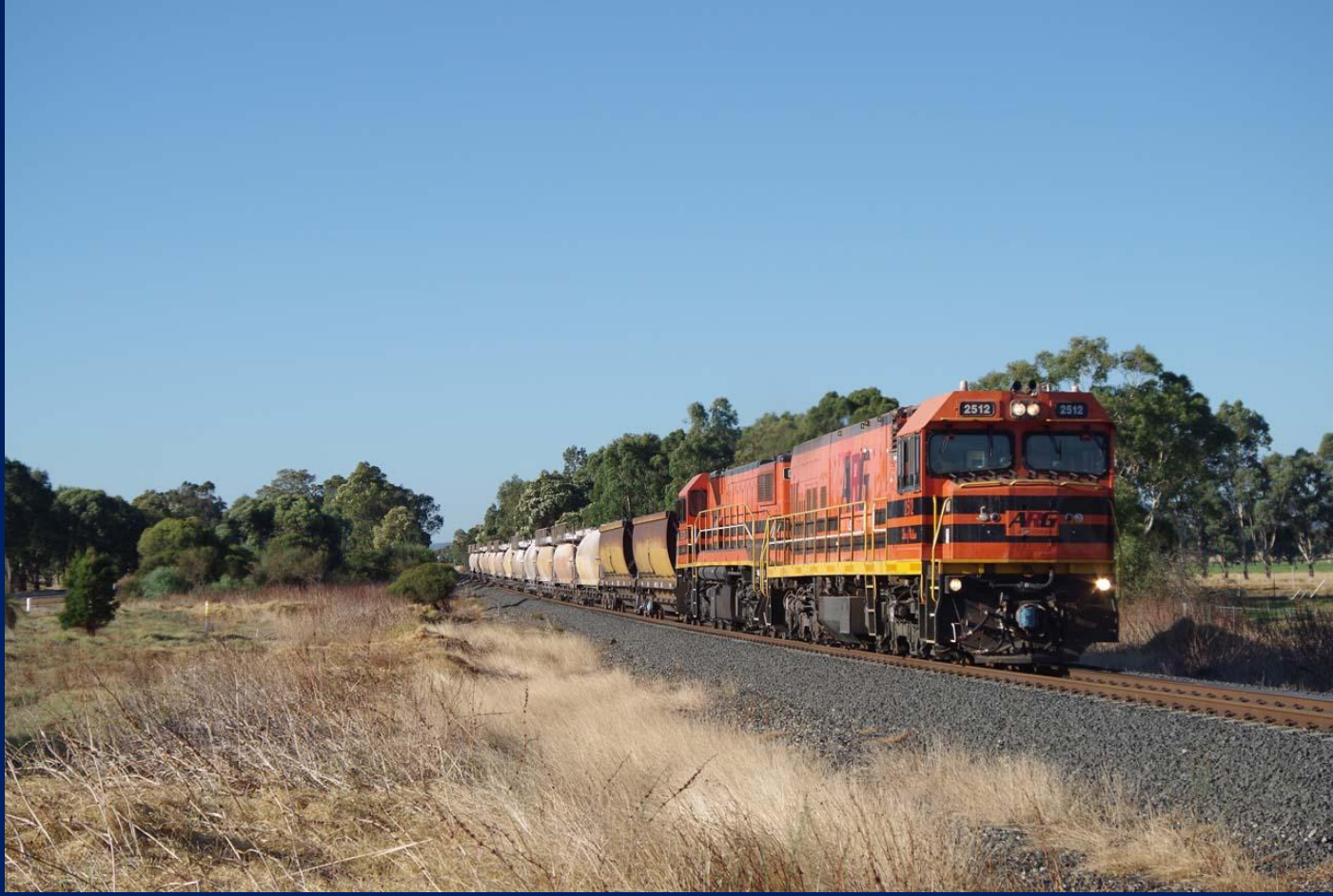
2512 & DBZ2304 on 1271 lime, with two empty coal wagons at Wokalup March 8th.