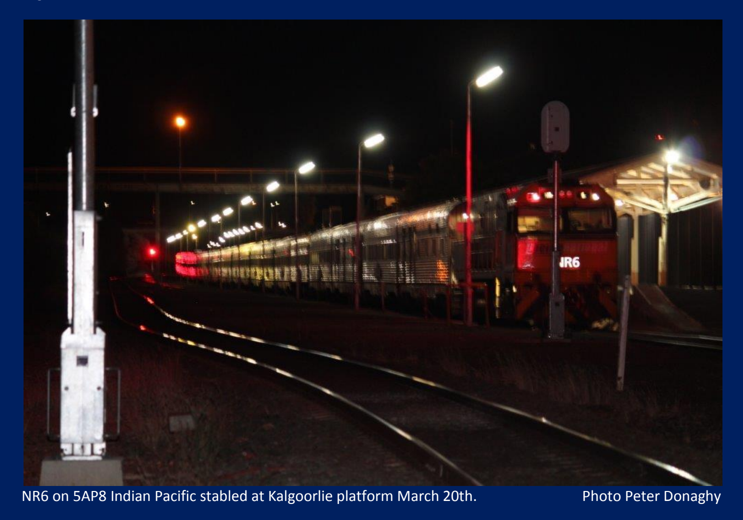
Page 24 of 24