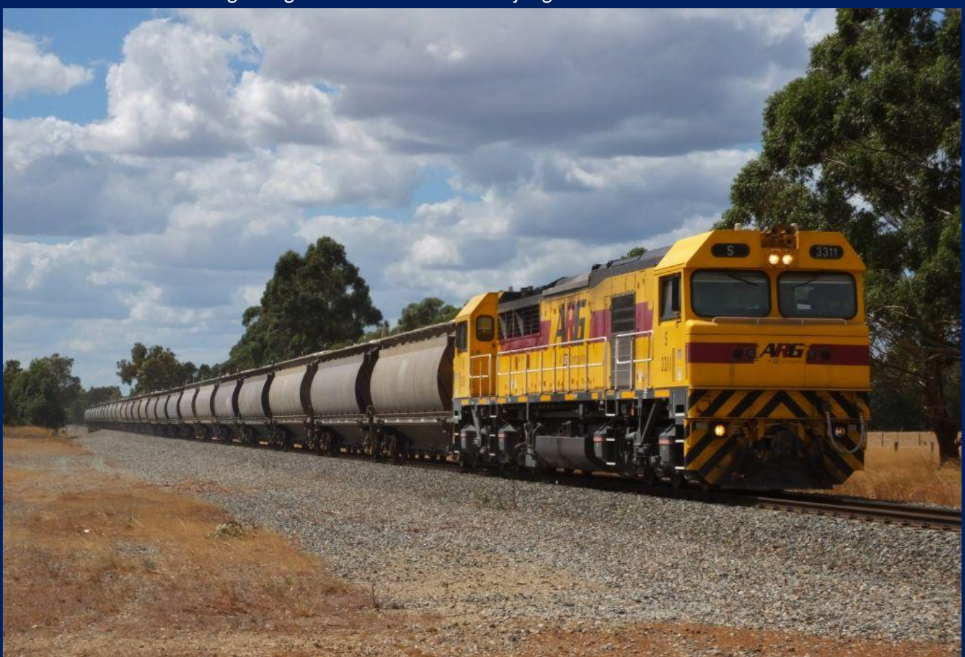
S3311 on 3233 empty alumina Kwinana to Calcine at Keysbrook March 3rd.