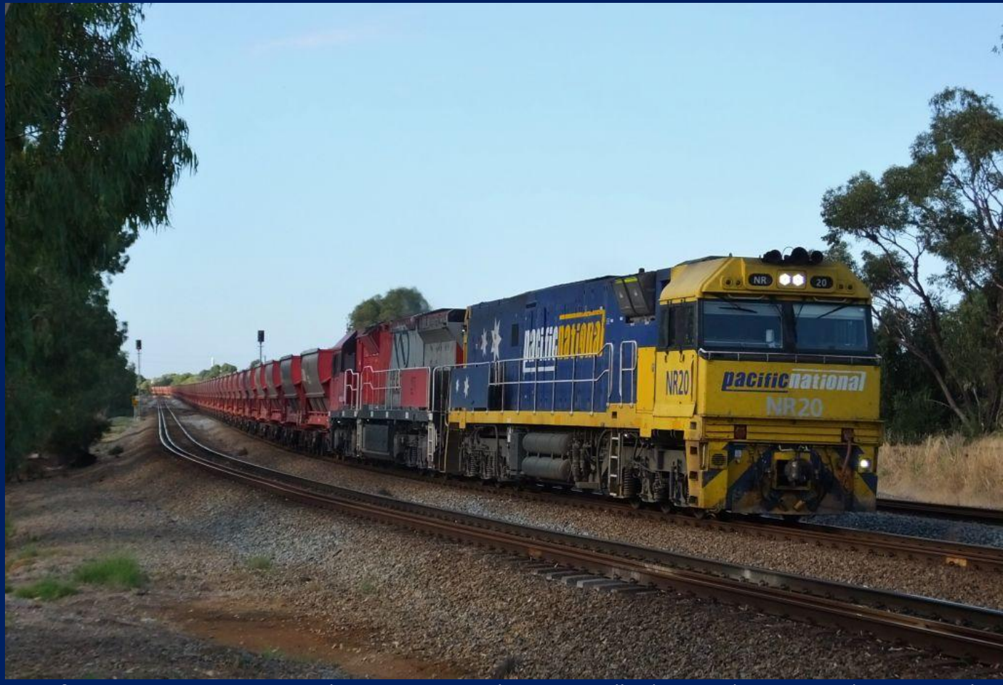
NR20 & MRL003 on 1033 empty Polaris ore to Mt Walton at Woodbridge March 1st. Photo