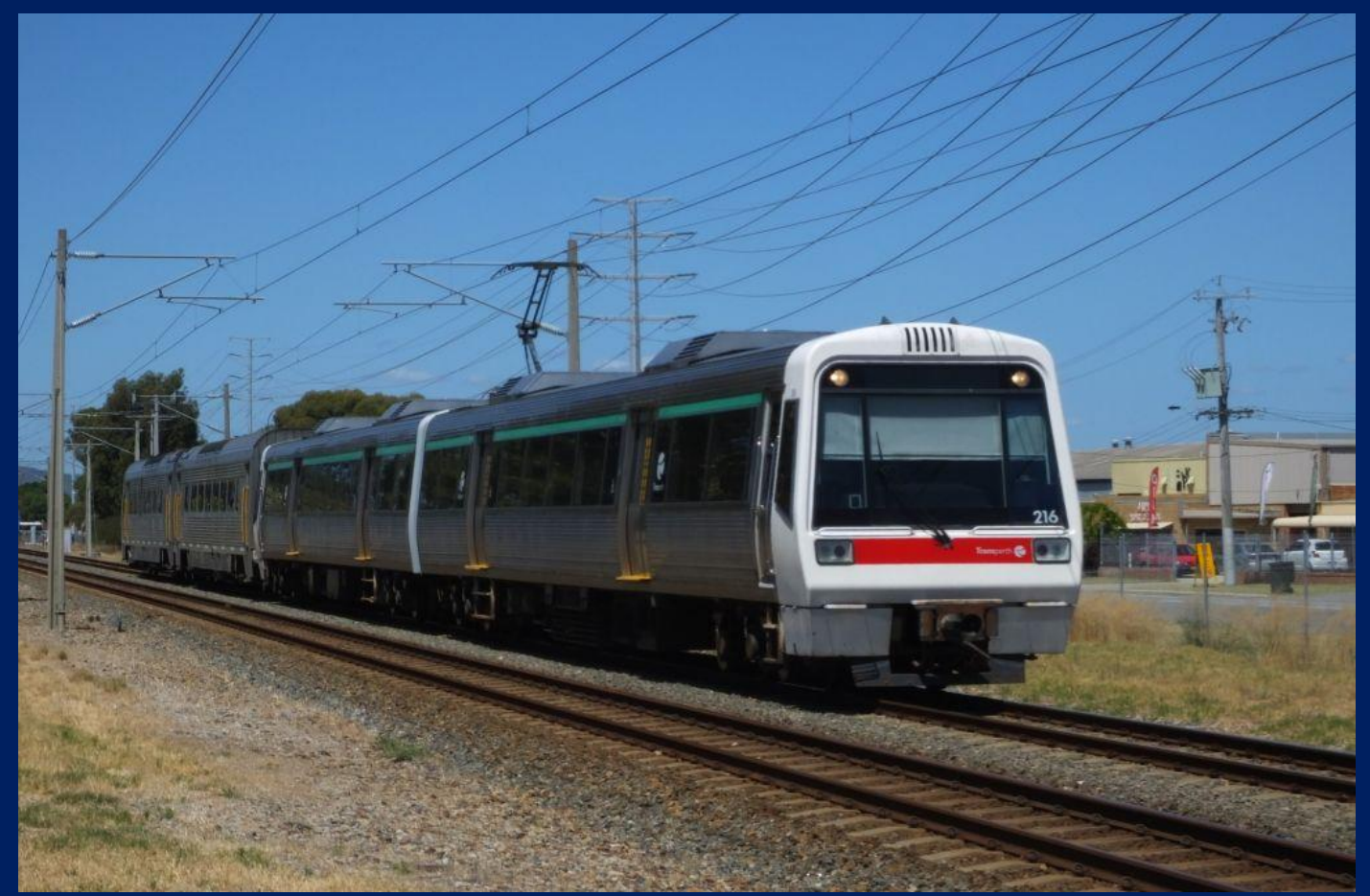
A series EMU set 16 hauls Australind cars back to Claisebrook from Armadale at Cannington March 4th.