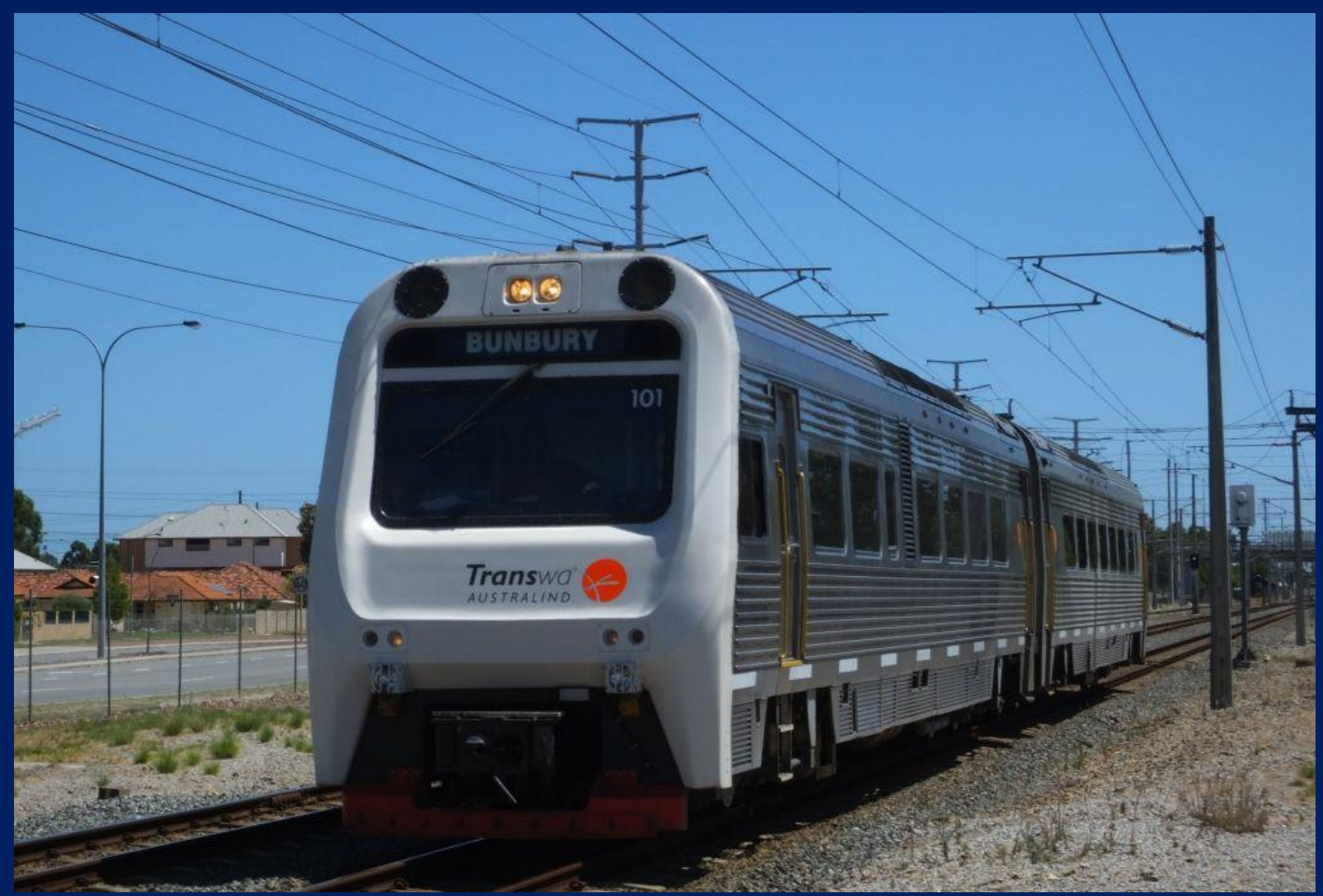
Australind power car ADP101 and trailer car ADQ121 on trial to Armadale at Cannington March 4th.