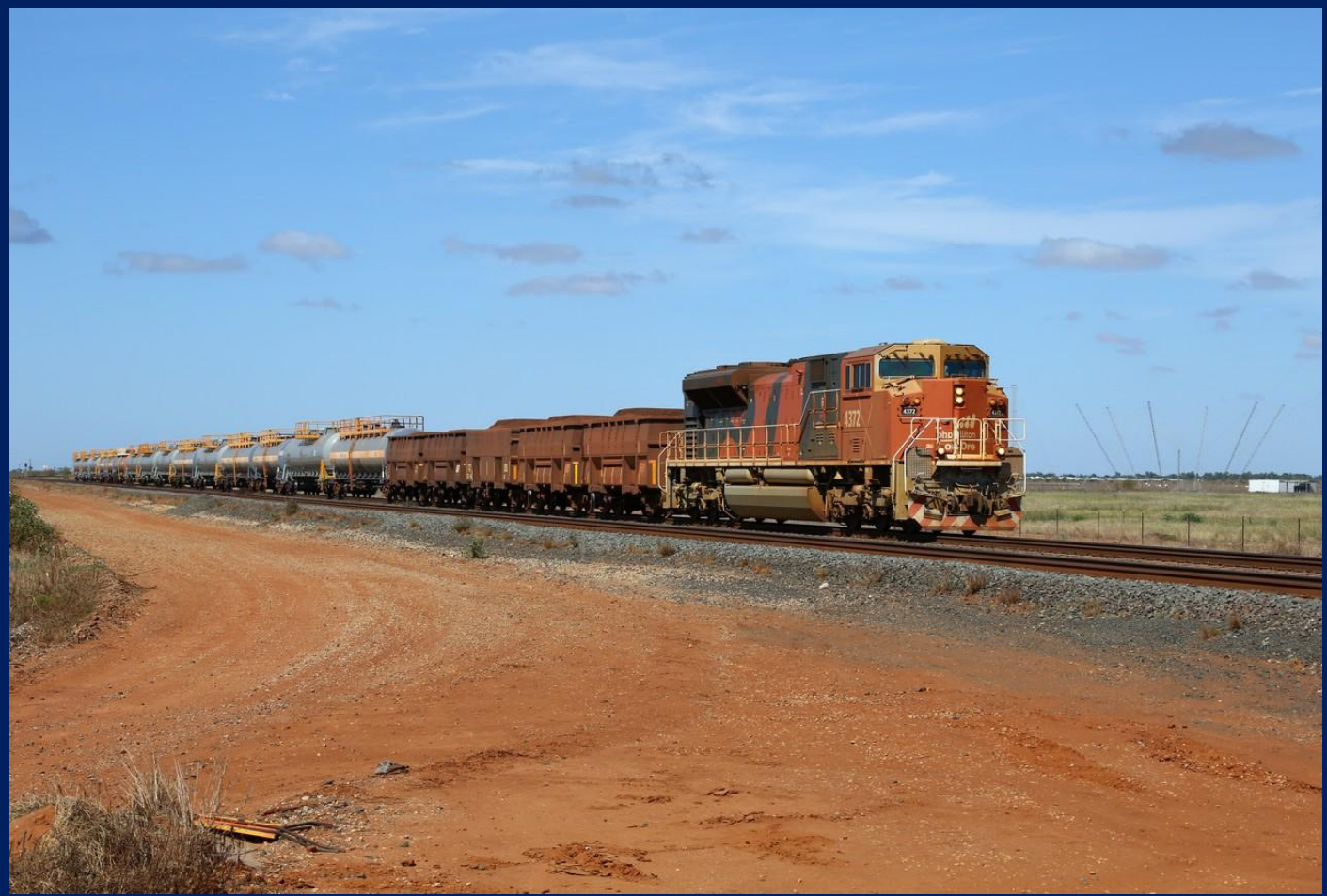
BHPBIO SD70ACe 4372 on empty fuel train and defect ore cars at Port Hedland March 14th.