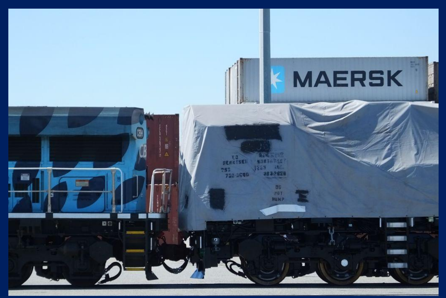
CBH009 nose to cab with new CBH025 under tarp at North Port Fremantle March 10th.