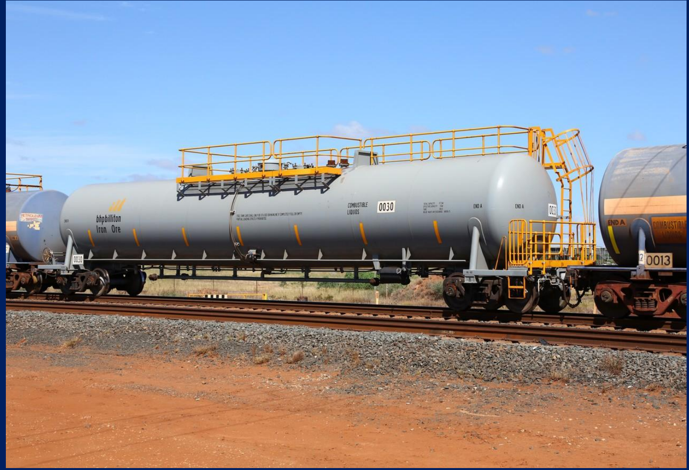
New Chinese built BHPBIO fuel tanker 030 on empty fuel train 14/3.