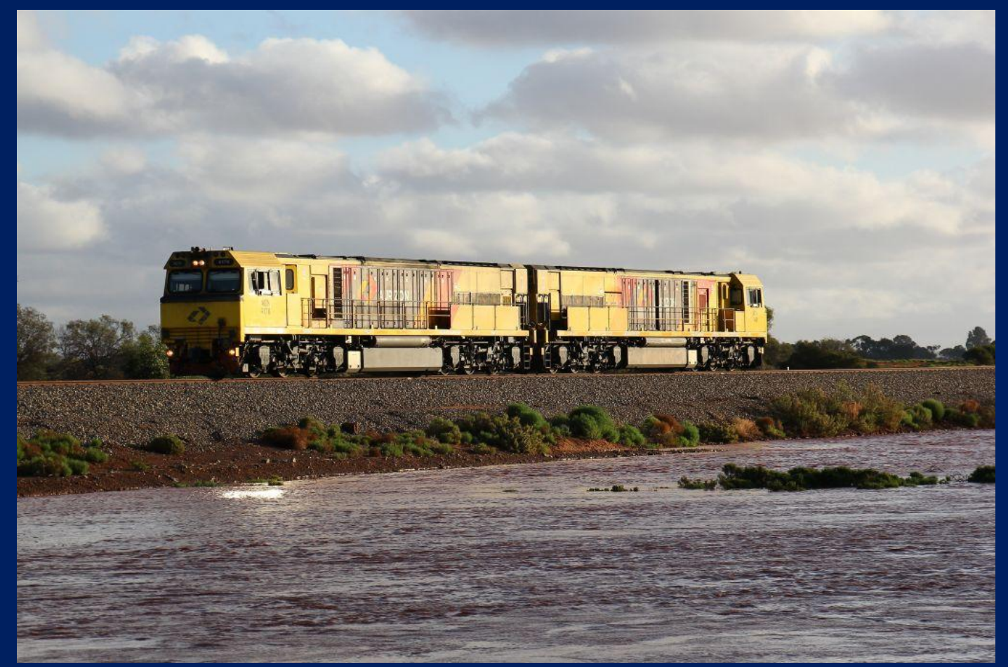
ACN4170 & ACN4169 light engines pass flooded area between Indarra and Tenindewa March 14th.