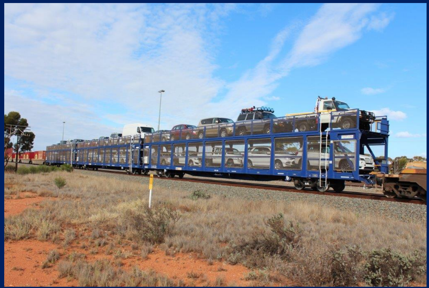
Pacific National new RMOY larger double deck car carriers at Parkeston March 6th.