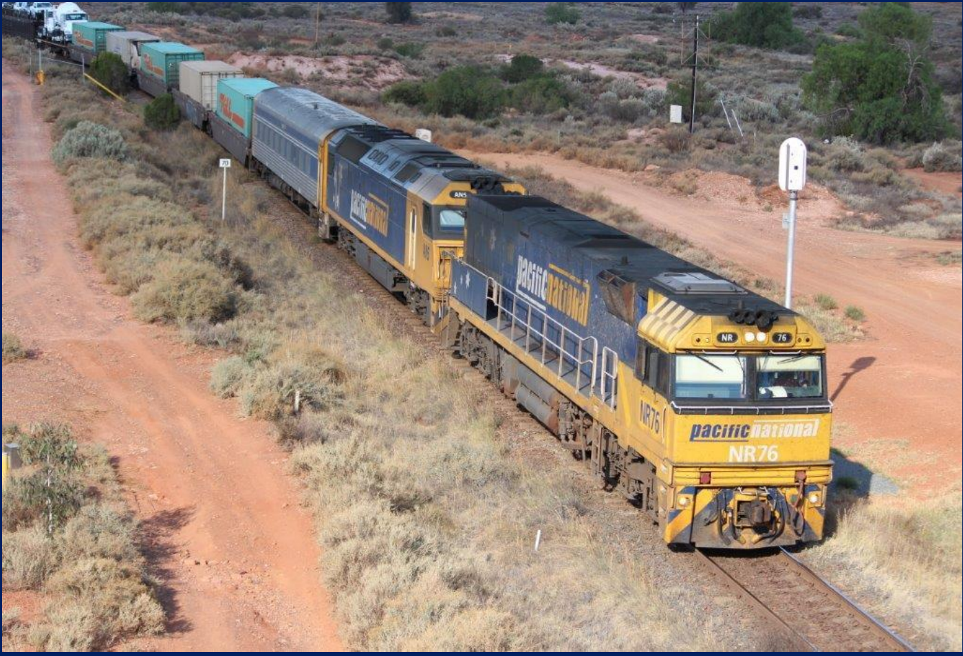
NR76 & AN5 on 2MP5 entering Brookfield Rail territory at Kalgoorlie March 11th.