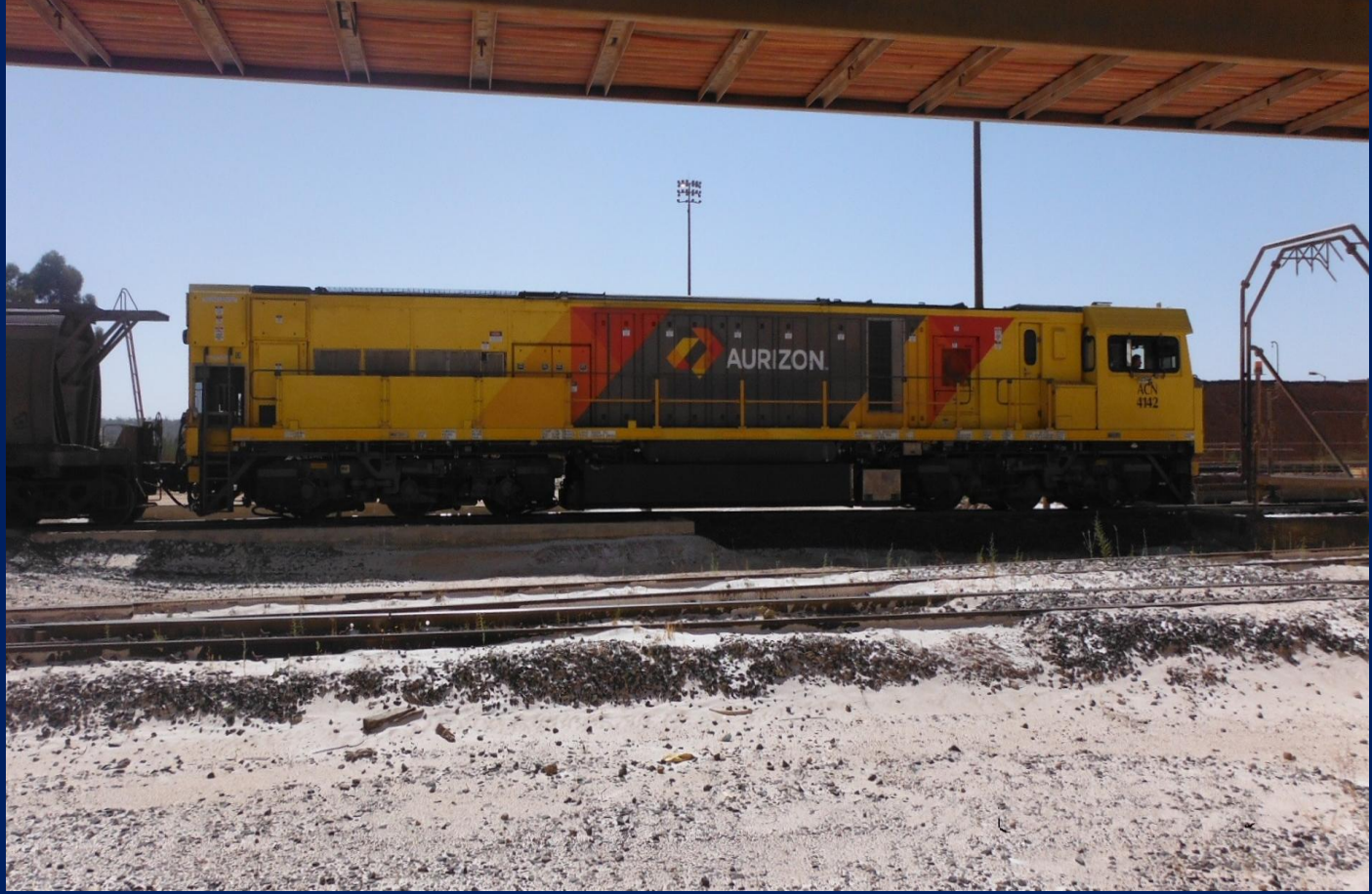
ACN4142 loading alumina hoppers at Worsley Alumina Refinery Hamilton on March 20th.