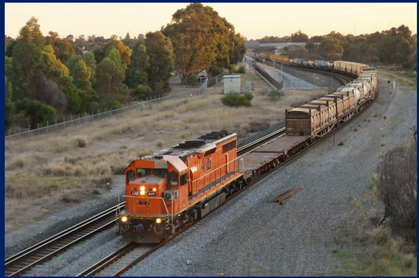
LZ3109 on 5025 Kwinana shunter at Kenwick just on dusk March 12th.