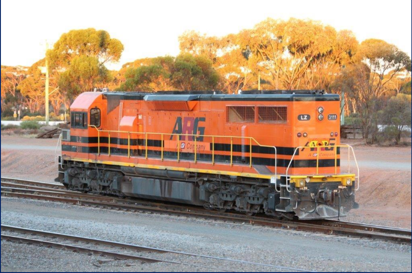
LZ3111 on 4B20 light engine from Hampton to West Kalgoorlie after stabling ballast rake 25/3.