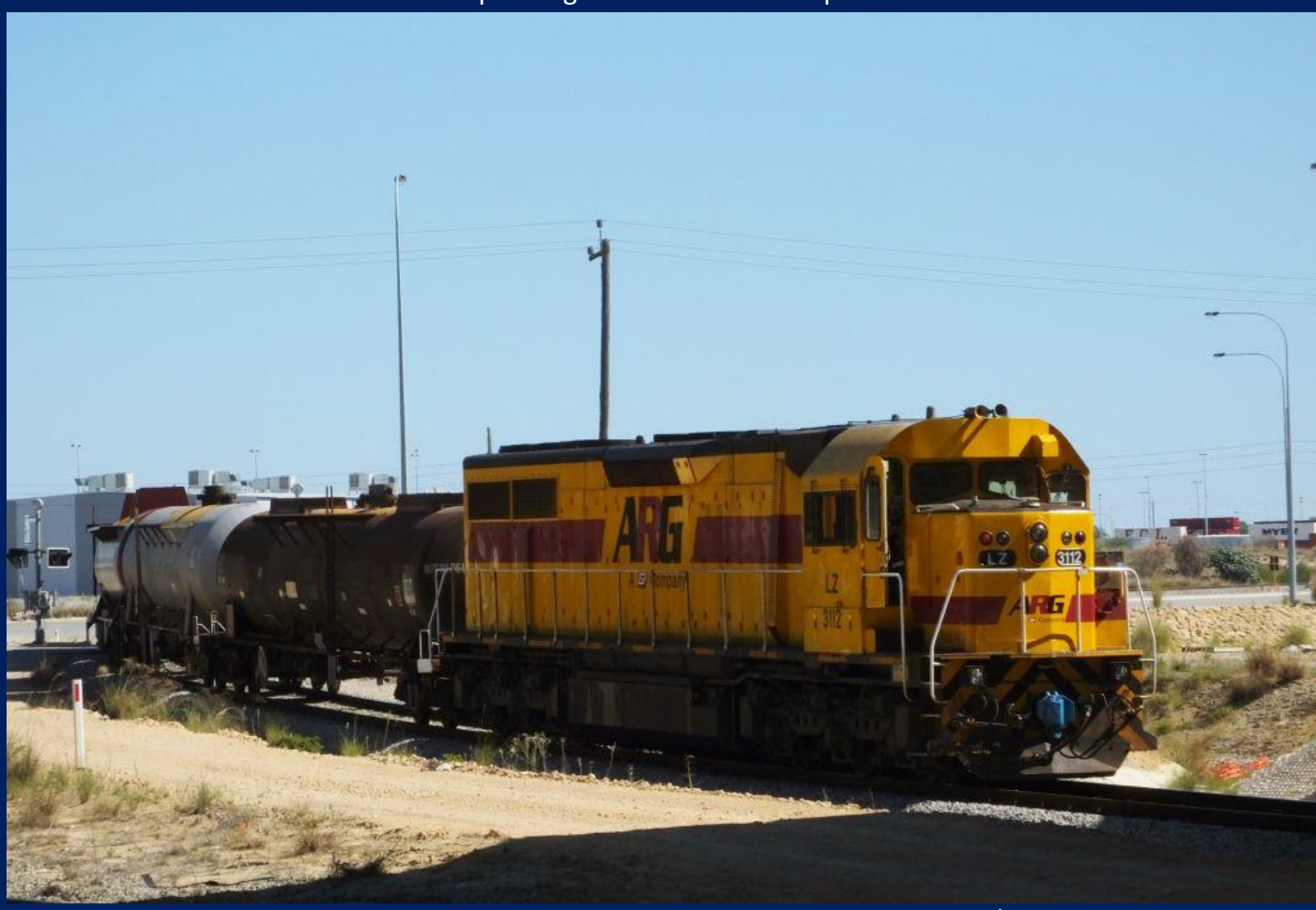
LZ3112 on 4SG4 shunter fuel tankers for Kalgoorlie from BP Terminal Kewdale 22/4.