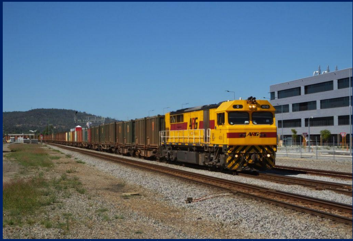
Q4010 on 5430 empty sulphur negotiating the deviation at Midland April 17th.