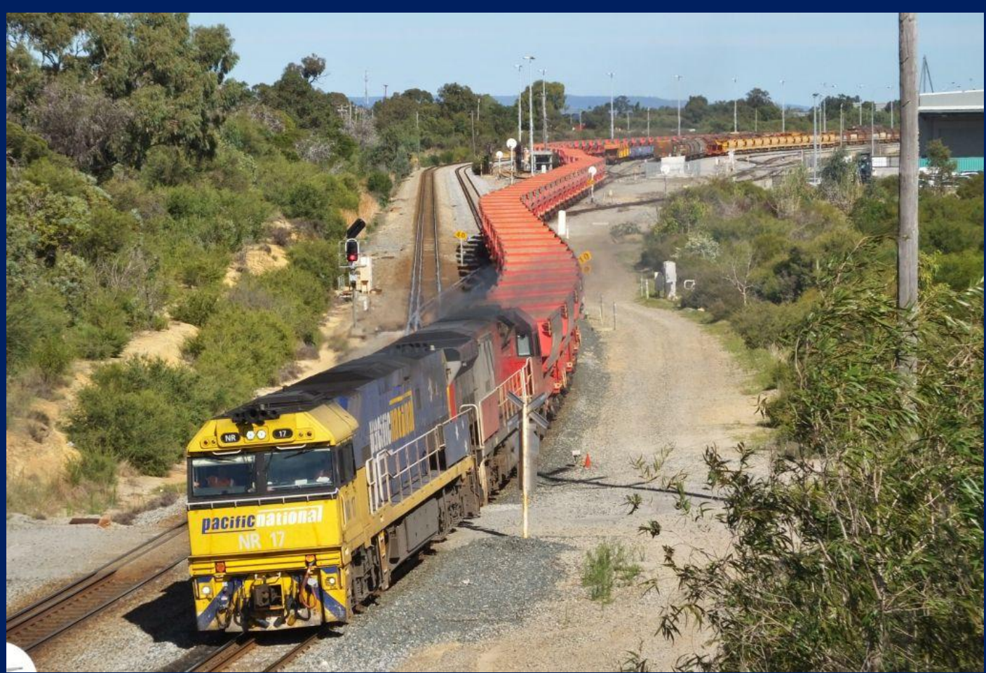
NR17 & MRL001 on 7035 empty Polaris ore departing Forrestfield yard for mine 25/4.