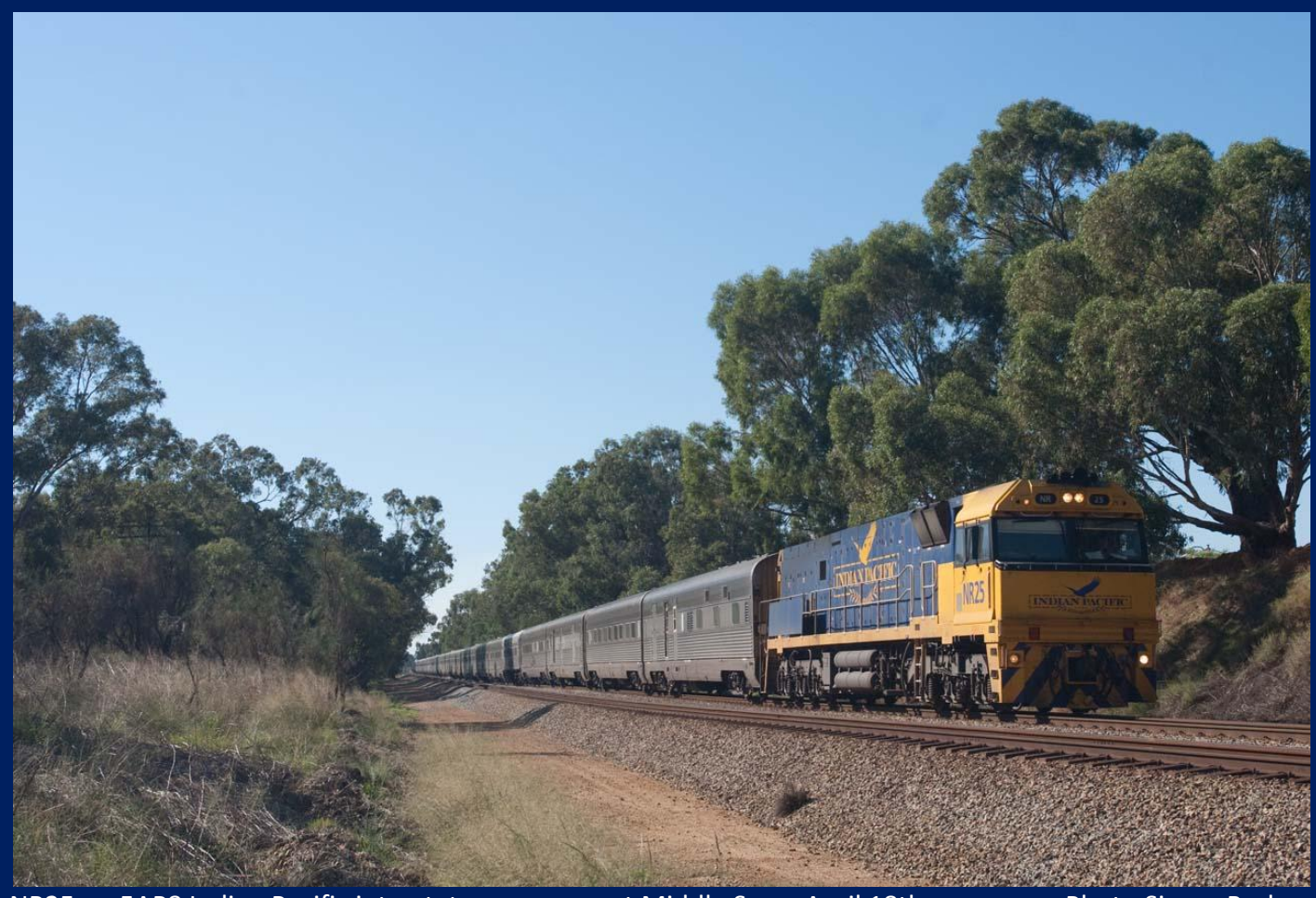
NR25 on 5AP8 Indian Pacific interstate passenger at Middle Swan April 18th.