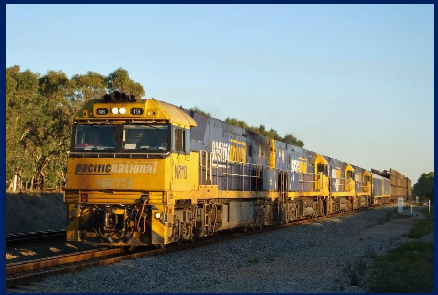
NR113, NR104 with dead attached NR110 & NR60 on 2PM5 at Hazelmere April 27th.