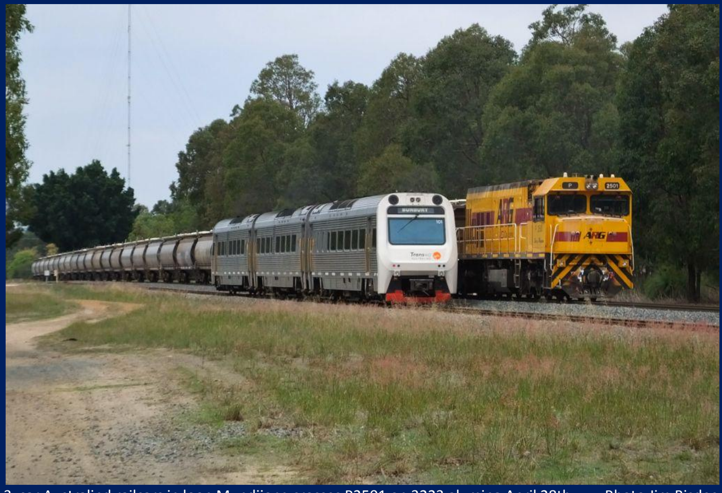
3xcar Australind railcars in loop Mundijong crosses P2501 on 3223 alumina April 28th.