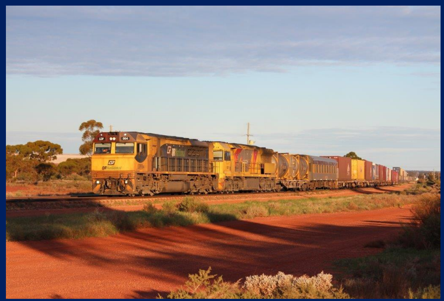
LDP004 & 6026 on 2MP1 Aurizon intermodal entering Parkeston April 22nd.