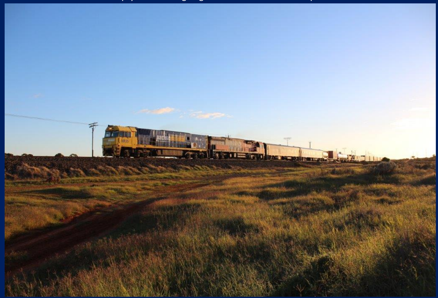
NR35 & MRL005 returning on 5MP2 approaching West Kalgoorlie April 26th.