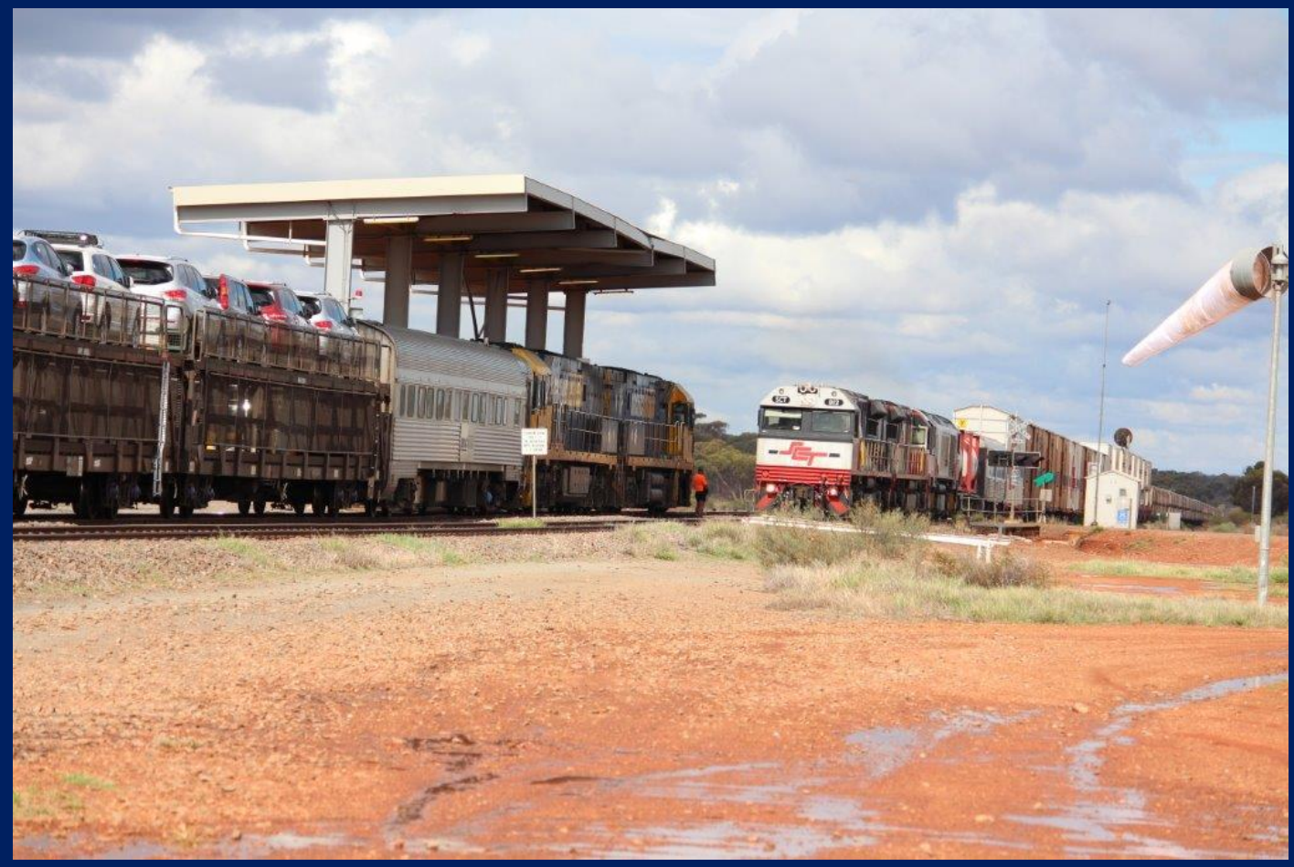
SCT012, SCT013 & CSR007 on 5MP9 SCT freight crossing 6PM6 NR45 & NR121 Parkeston April 4th.