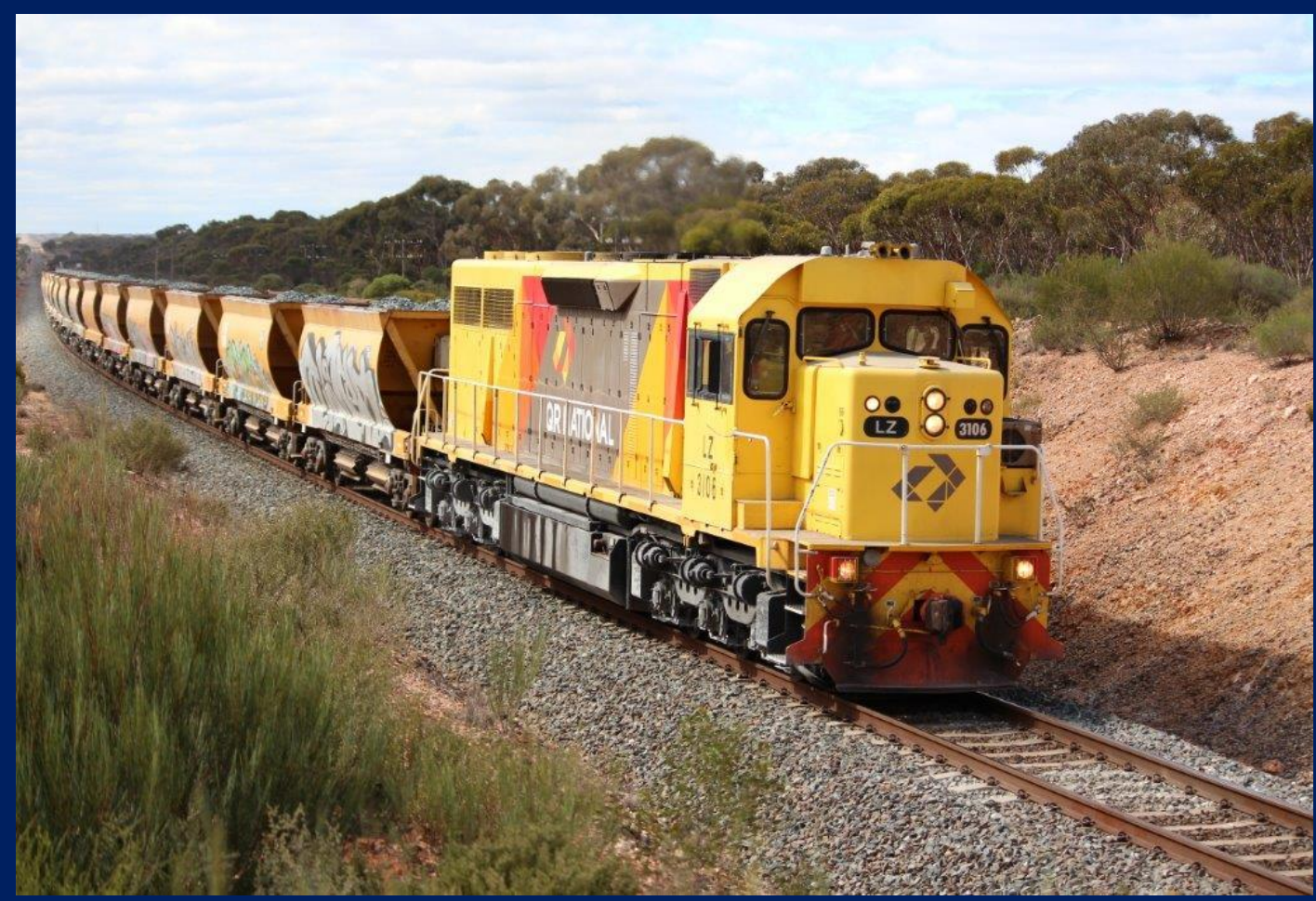
LZ3106 on 2BK2 ballast West Kalgoorlie to Darrine at Binduli April 27th.