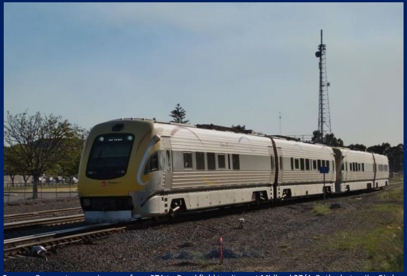
Four car Prospector crossing over from PTA to Brookfield territory at Midland 27/4.