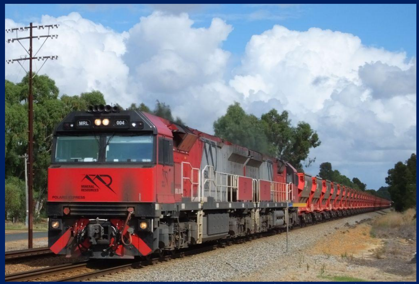
MRL004 & MRL002 on 7035 empty Polaris ore Millendon Junction April 11th.