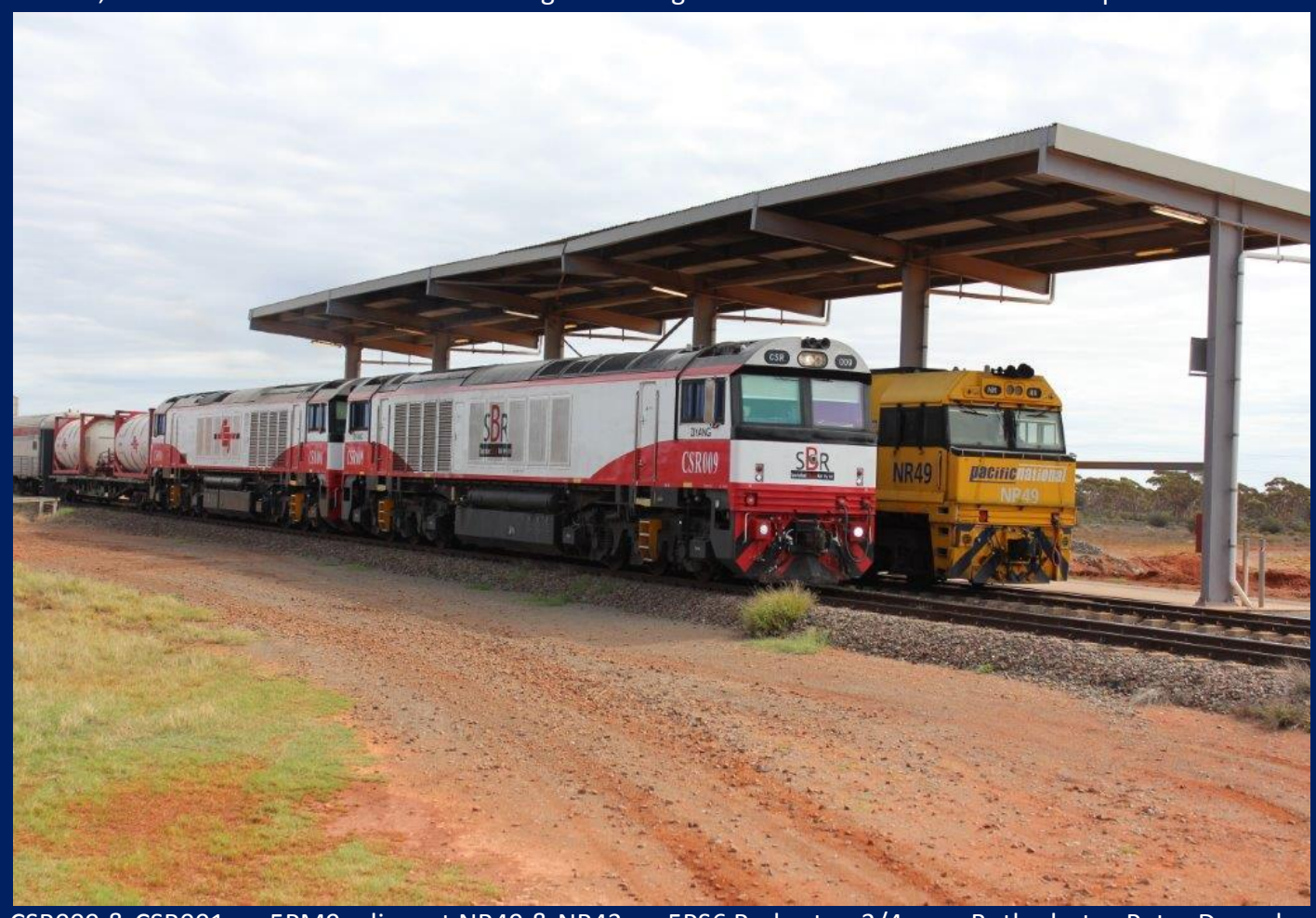
CSR009 & CSR001 on 5PM9 adjacent NR49 & NR43 on 5PS6 Parkeston 3/4.