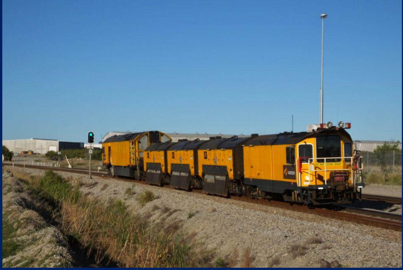
MMY32 rail grinder passing 44 signal at Kewdale on April 26th.