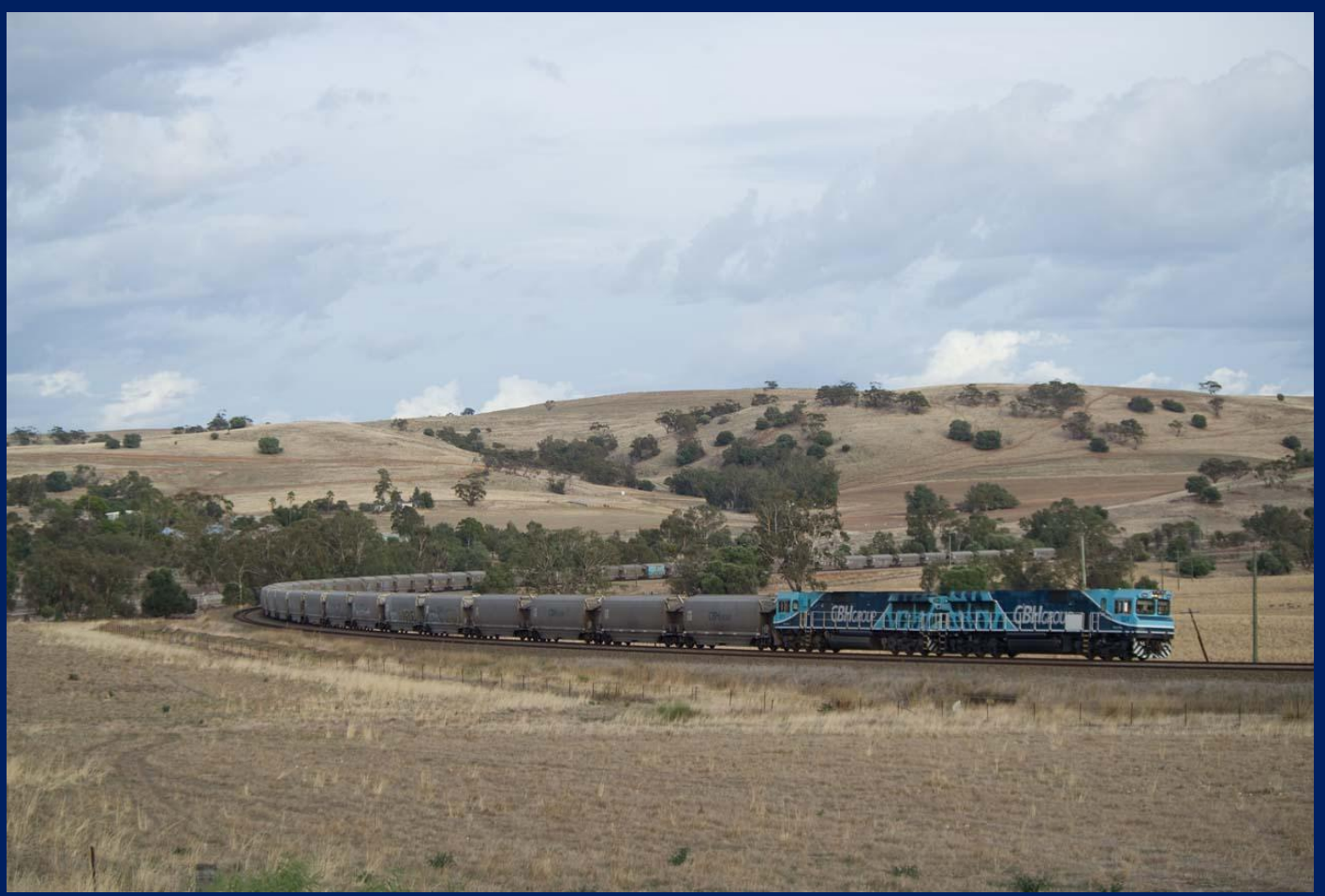
CBH024 & CBH011 on 2K25 empty Watco grain approaching Avon Yard Northam 6/4.