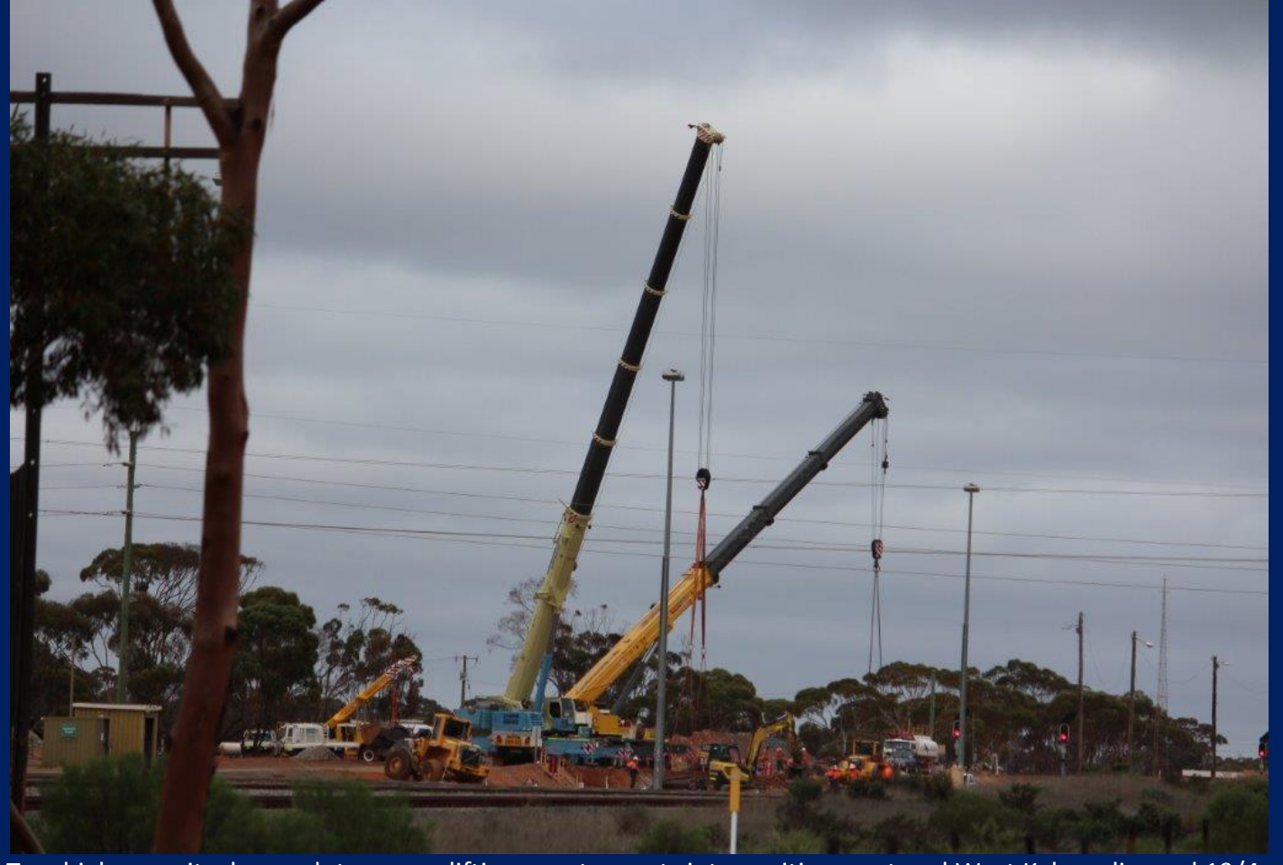
Two high capacity, heavy duty cranes lifting new turnouts into position west end West Kalgoorlie yard 19/4