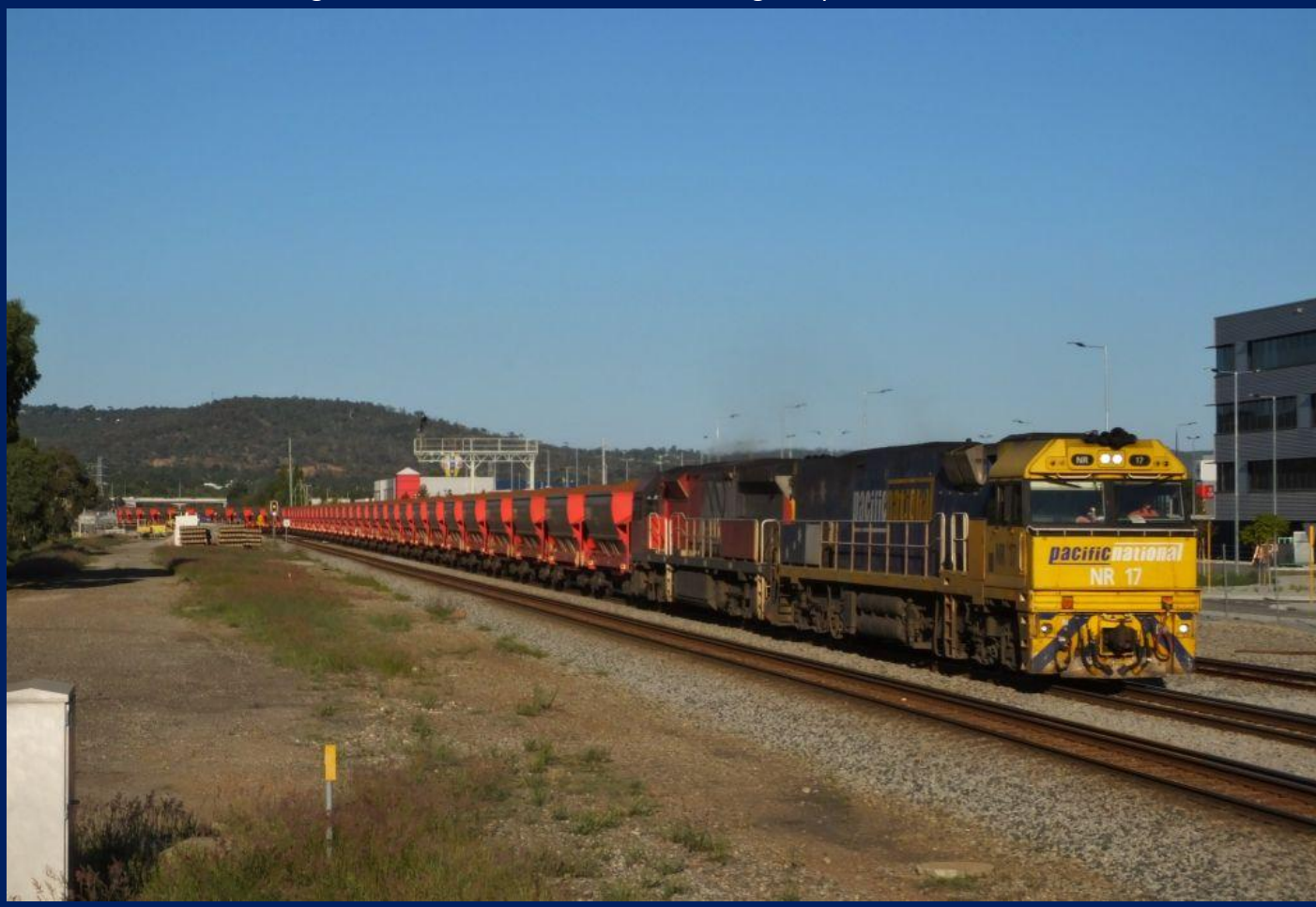
NR17 & MRL001 on 2032 Polaris ore at Midland April 27th.