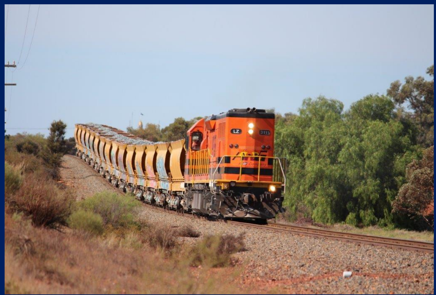
LZ3111 on 7BT5 ballast on Leonora line at Scotia April 4th.