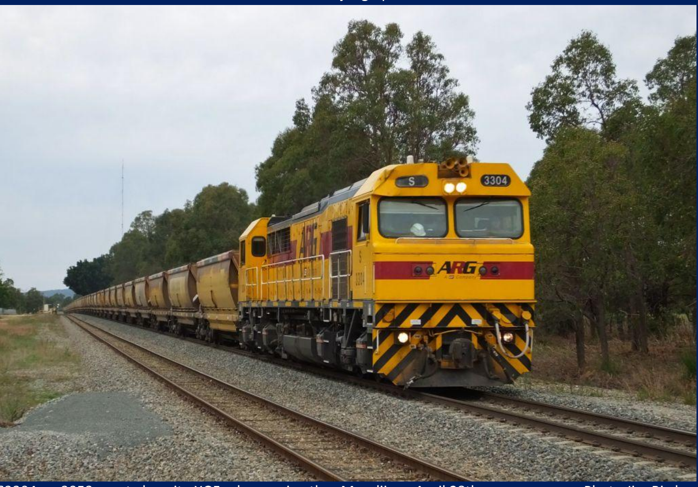
S3304 on 3953 empty bauxite XGF rake running thru Mundijong April 28th.