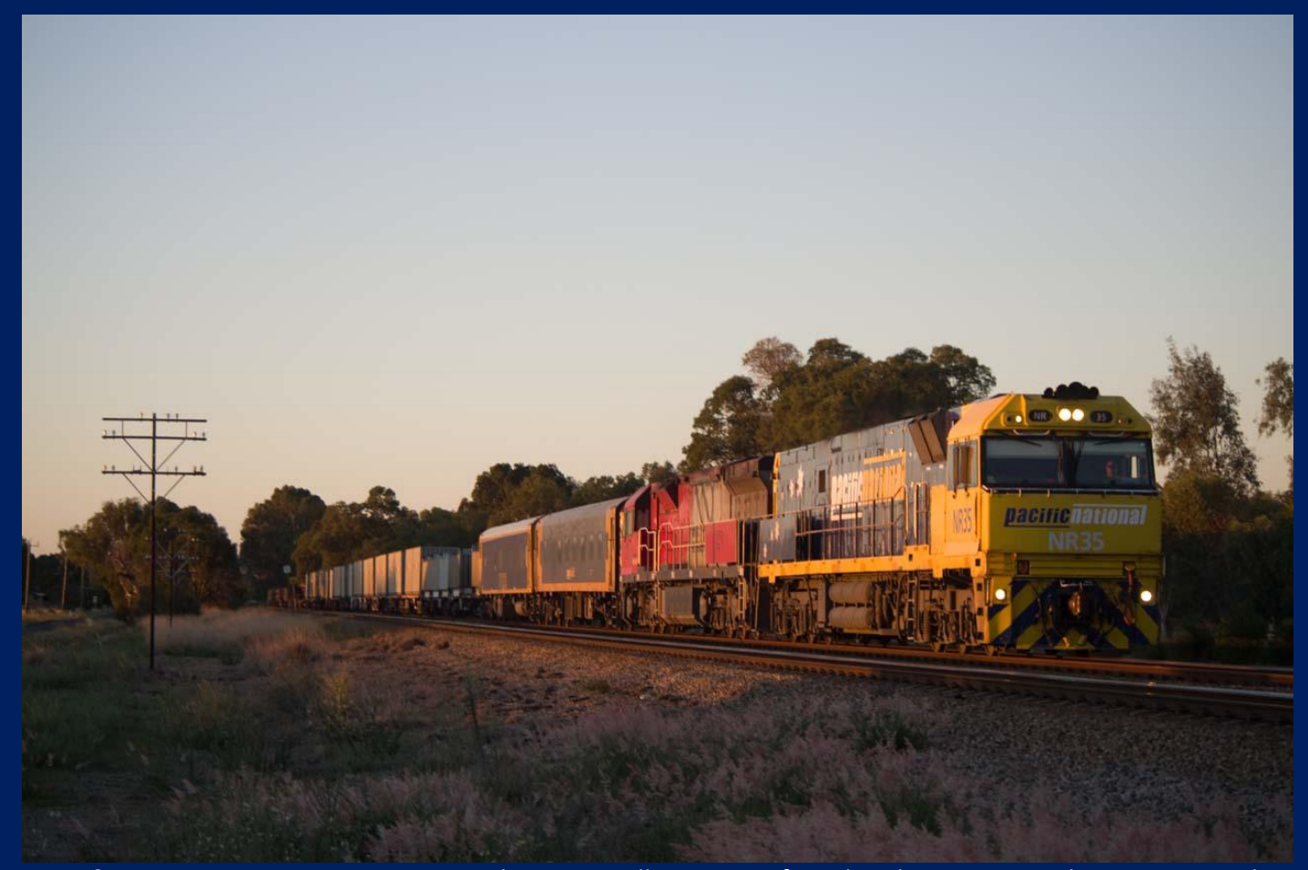
NR35 & MRL005 returning on 5MP2 steel at Hene Hill evening of April 26th.