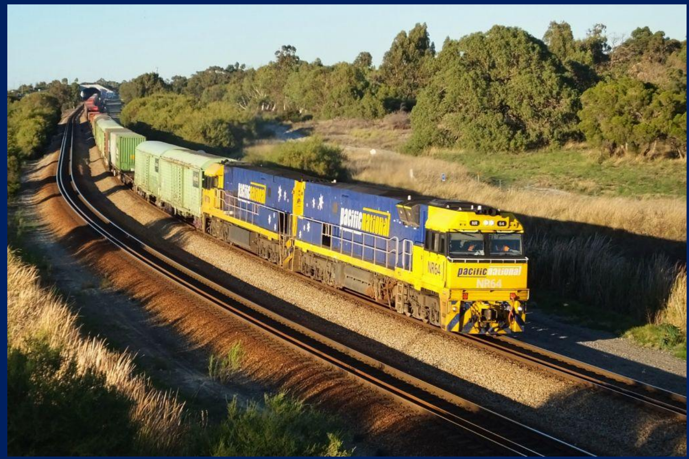
NR64 & NR111 on 1PS6 intermodal at South Guildford April 26th.