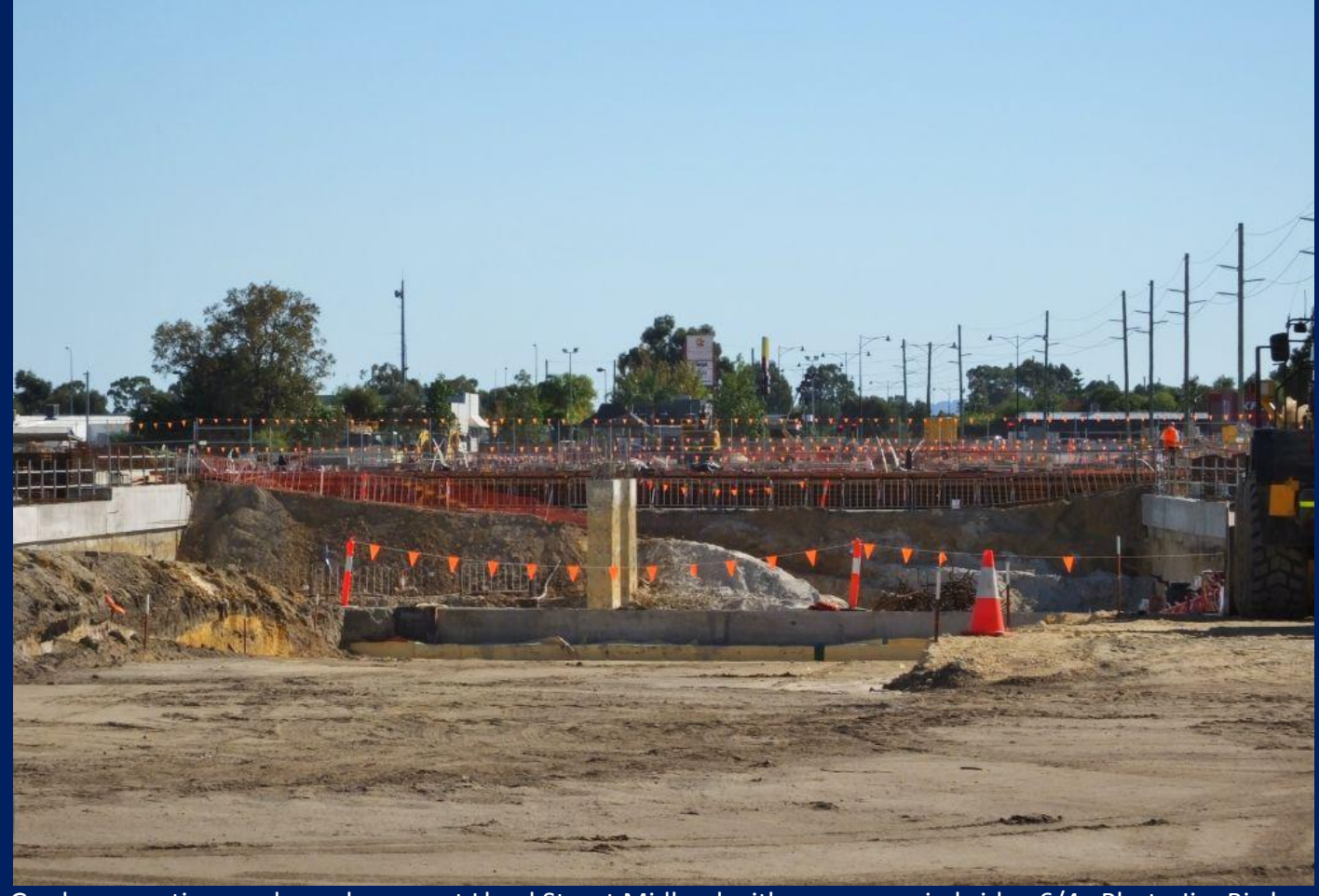
Grade separation works under way at Lloyd Street Midland with new up main bridge 6/4.