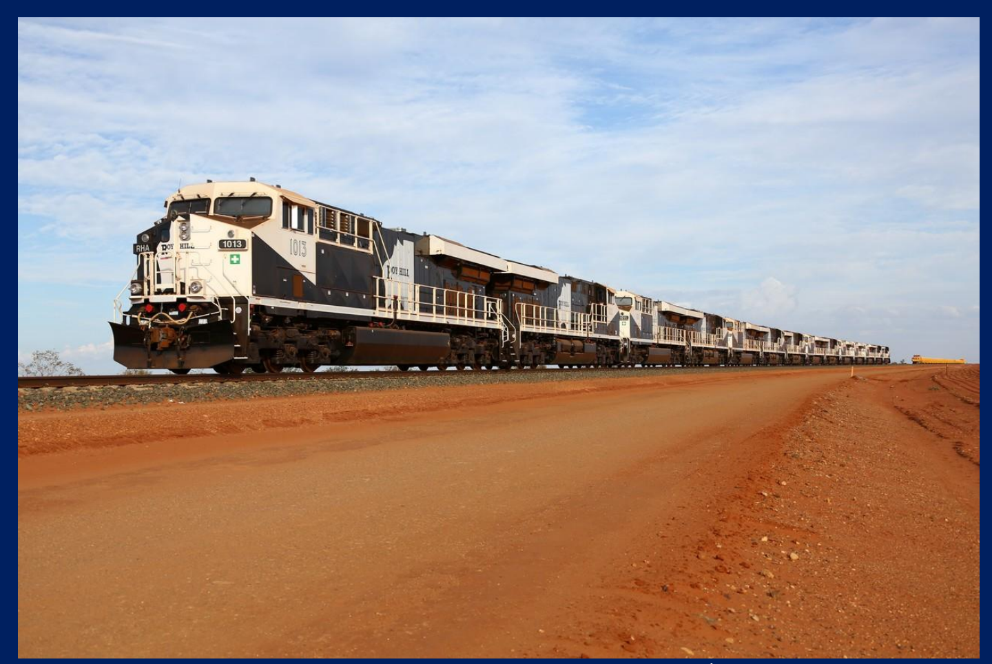
Roy Hill locomotives RHA1013 to RHA1001, rail train stabled Port Hedland 12/4.