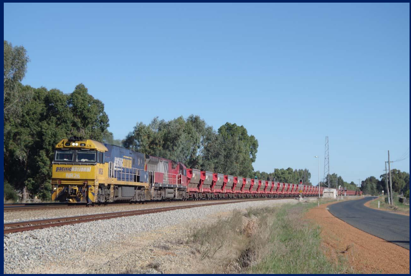
NR26 & MRL003 on 1035 empty Polaris ore going thru Millendon Junction April 26th.