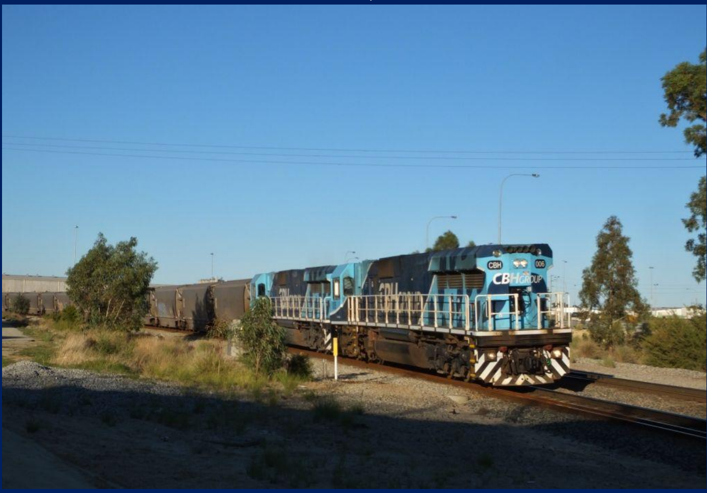
CBH009 & CBH023 on 1K13 empty Watco grain onto Miling line at Kewdale April 26th.