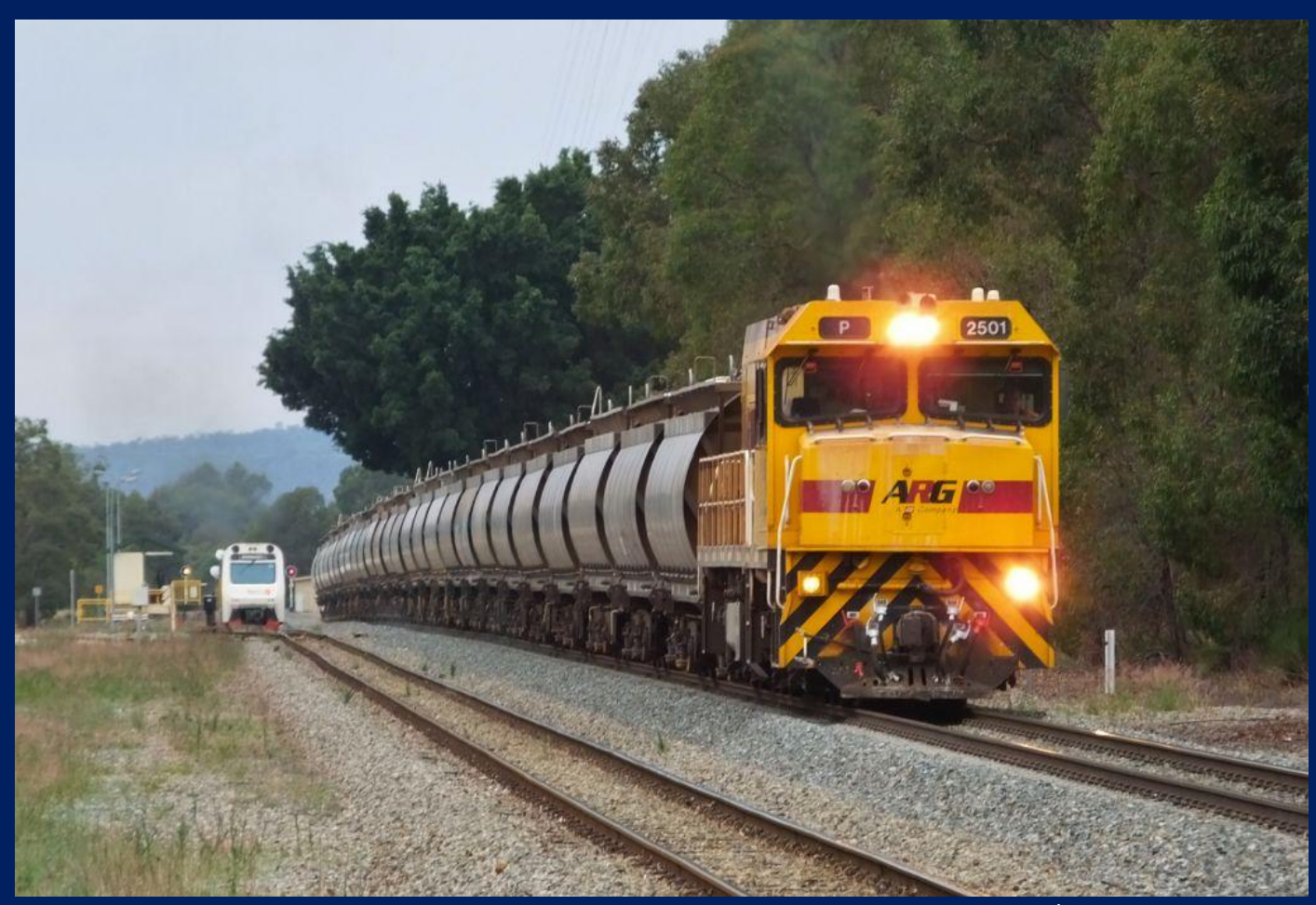
P2501 on 3223 alumina departing Mundijong with Australind at Mundijong Station 28/4.