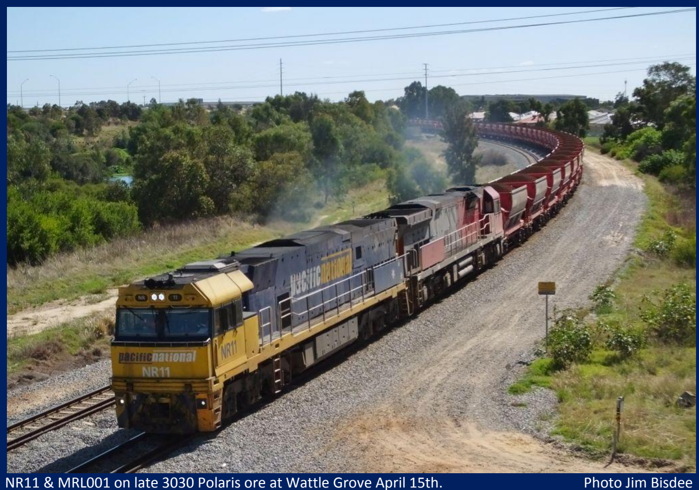
NR11 & MRL001 on late 3030 Polaris ore at Wattle Grove April 15th.