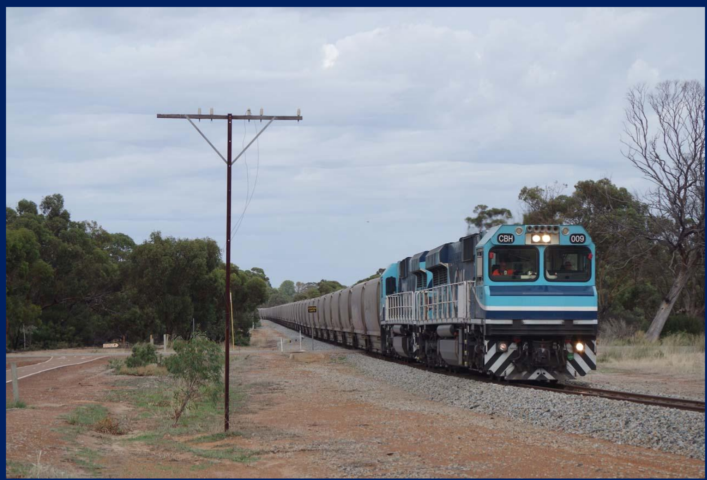
CBH009 & CBH023 on 2K43 empty Watco grain at Dowerin on April 6th.