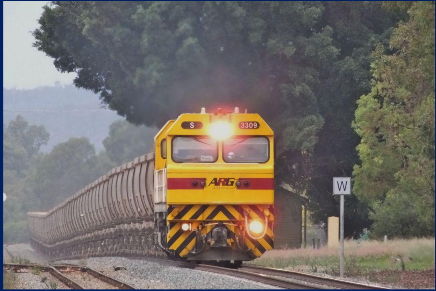
S3309 runs 3953 empty bauxite through Mundijong on way to Calcine Pinjarra April 28th.