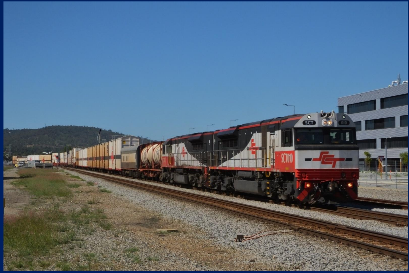
SCT010 & SCT011 on late 2MP9 SCT freight negotiating deviation at Lloyd Street Midland April 17th.