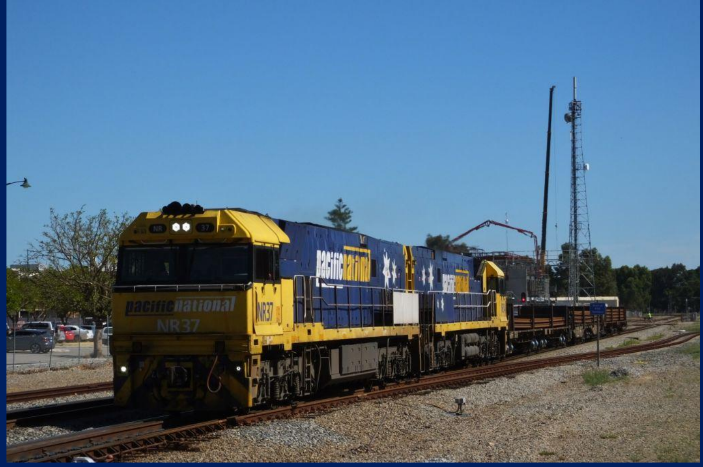
NR37 & NR54 on 6P31 3x2pack wagons of rail to flashbutt yard at Midland April 17th.