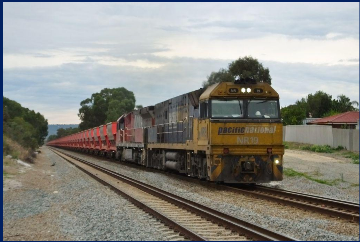
NR19 & MRL001 on 4030 Polaris ore Mt Walton to Kwinana at Thornlie April 29th.