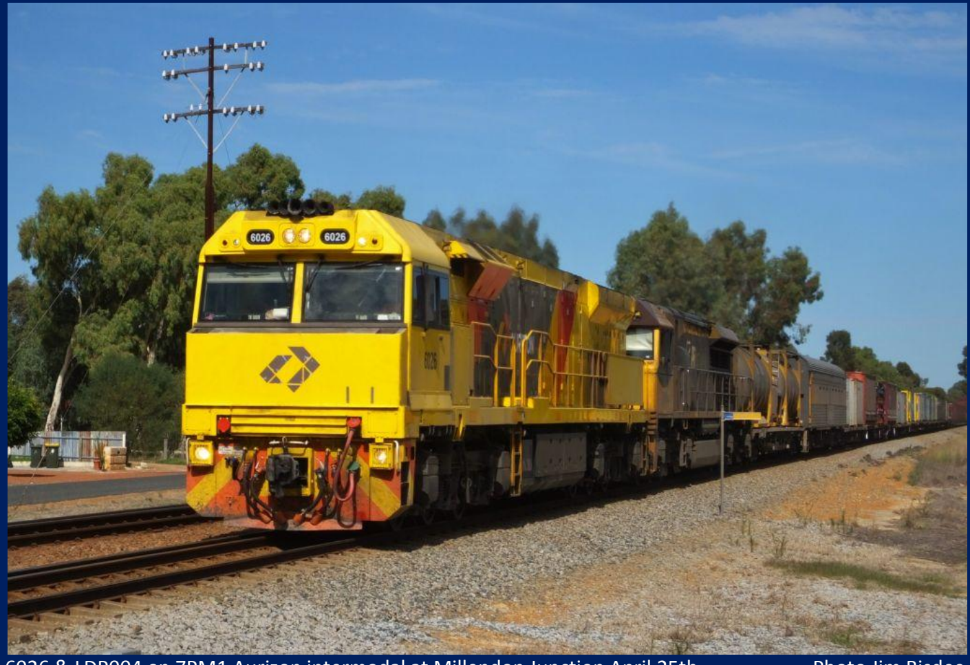
6026 & LDP004 on 7PM1 Aurizon intermodal at Millendon Junction April 25th.