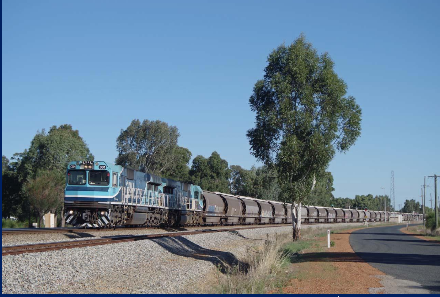
CBH001 & CBH015 on 1K43 empty Watco grain on leased XU rake at Millendon 26/4.