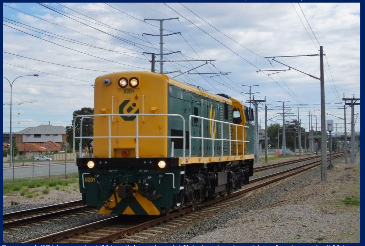
Transperth/PTA locomotive U201 on light engine trial Claisebrook to Armadale at Cannington April 30th.