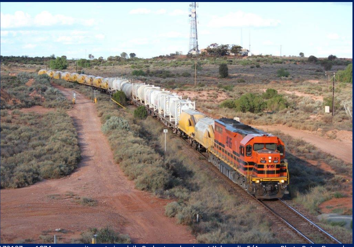
LZ3107 on 1C74 now a rarity on twice daily Parkeston shunter at Kalgoorlie 5/4.