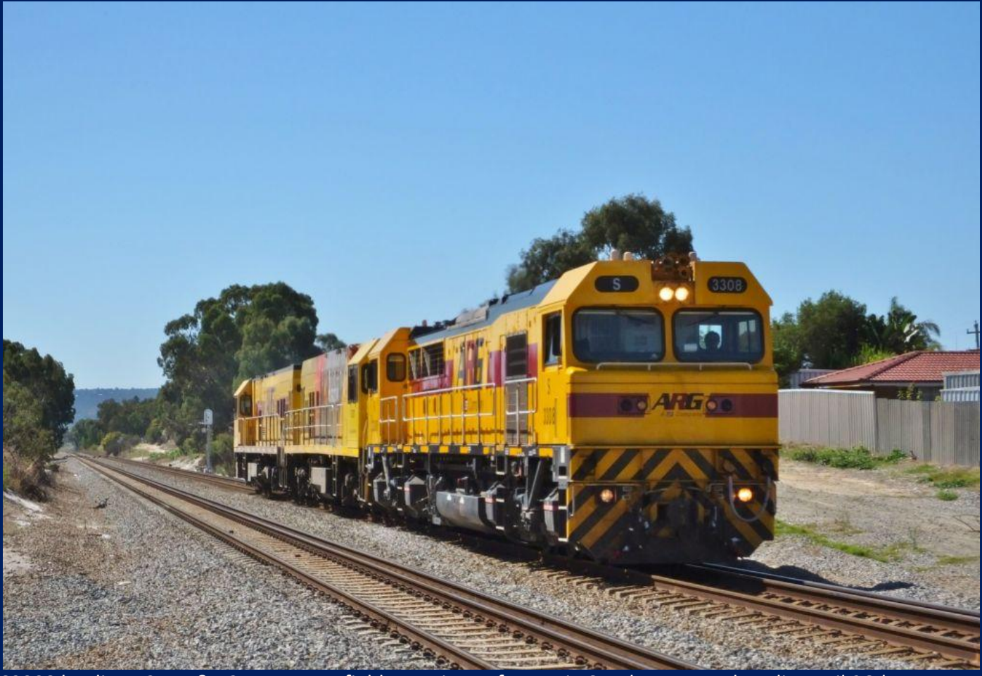
S3308 hauling P2517 & P2511 Forrestfield to Kwinana for use in South West at Thornlie April 26th.