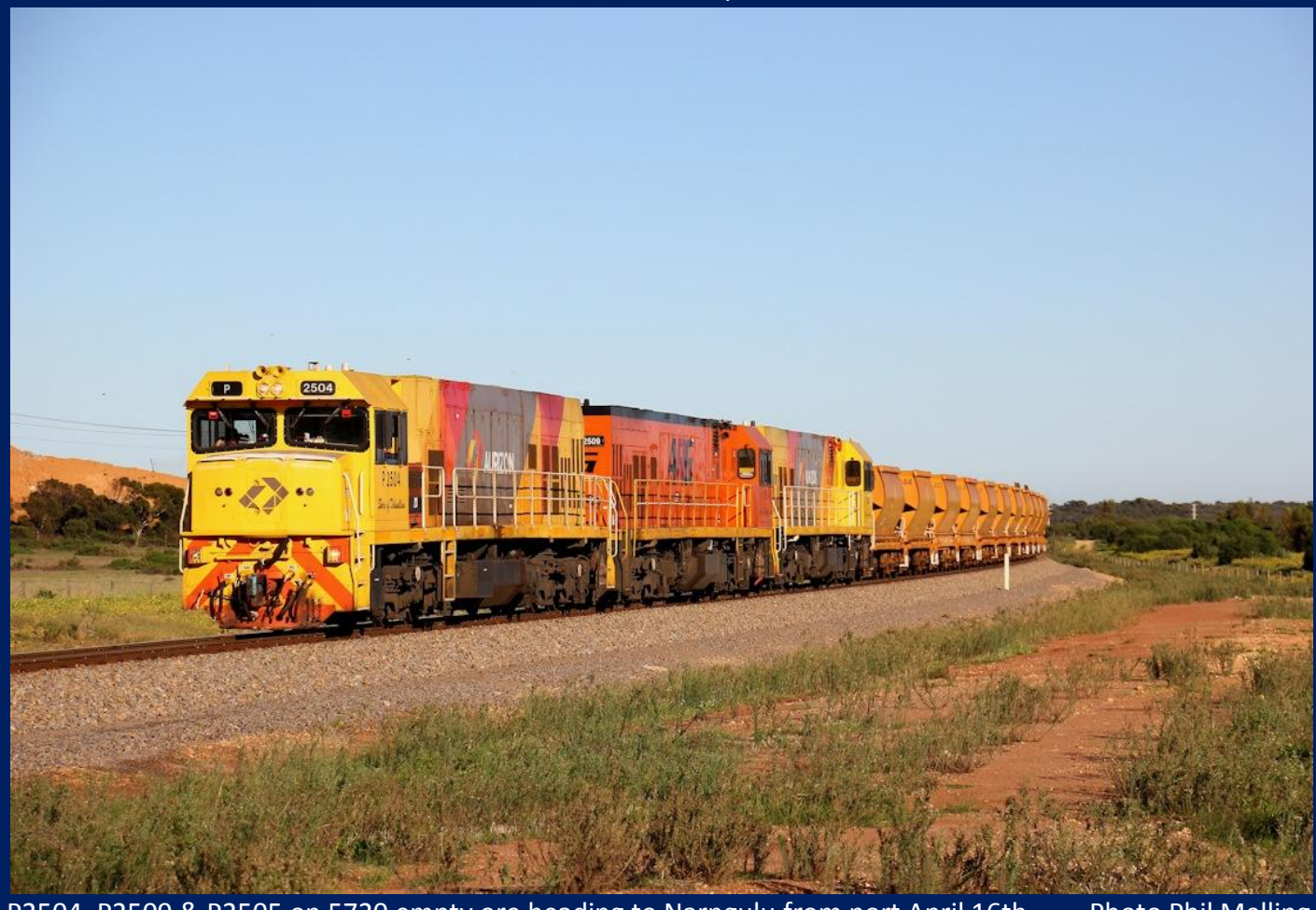
P2504, P2509 & P2505 on 5720 empty ore heading to Narngulu from port April 16th.