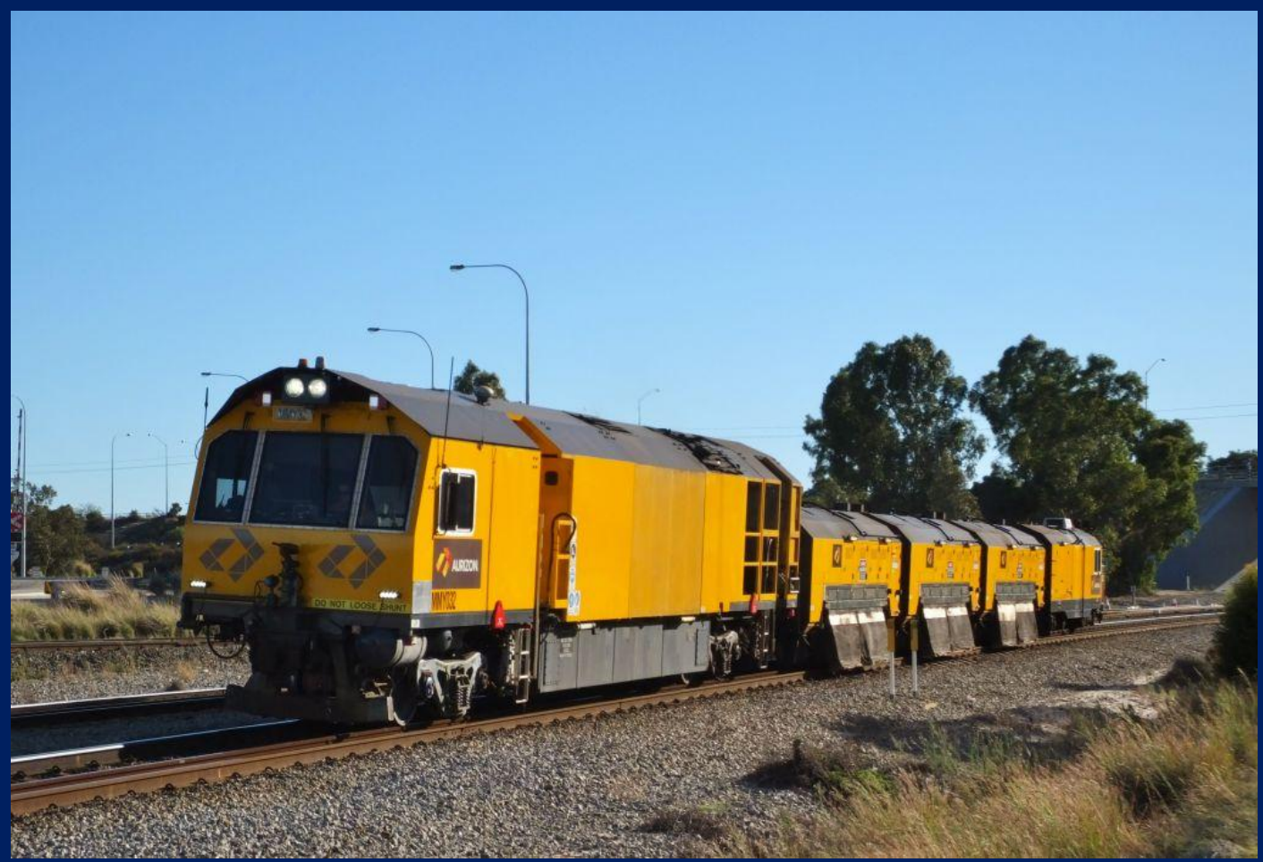
MMY32 Aurizon rail grinder in narrow gauge configuration passing thru Kewdale 26/4.