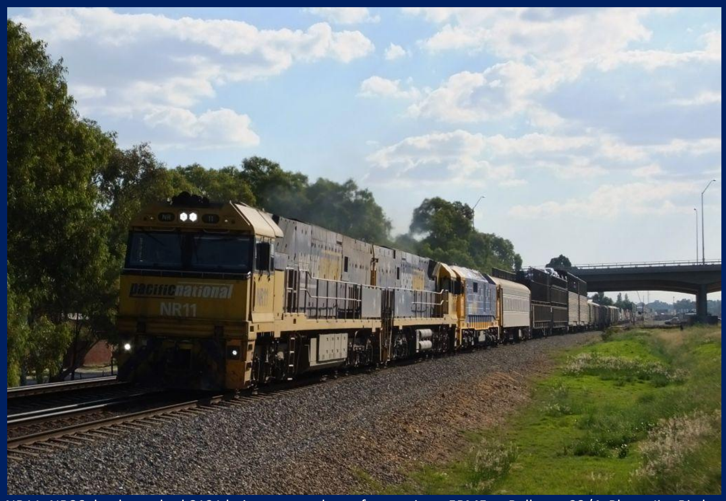
NR11, NR86 dead attached 8121 being returned east for repair on 5PM5 at Bellevue 23/4.