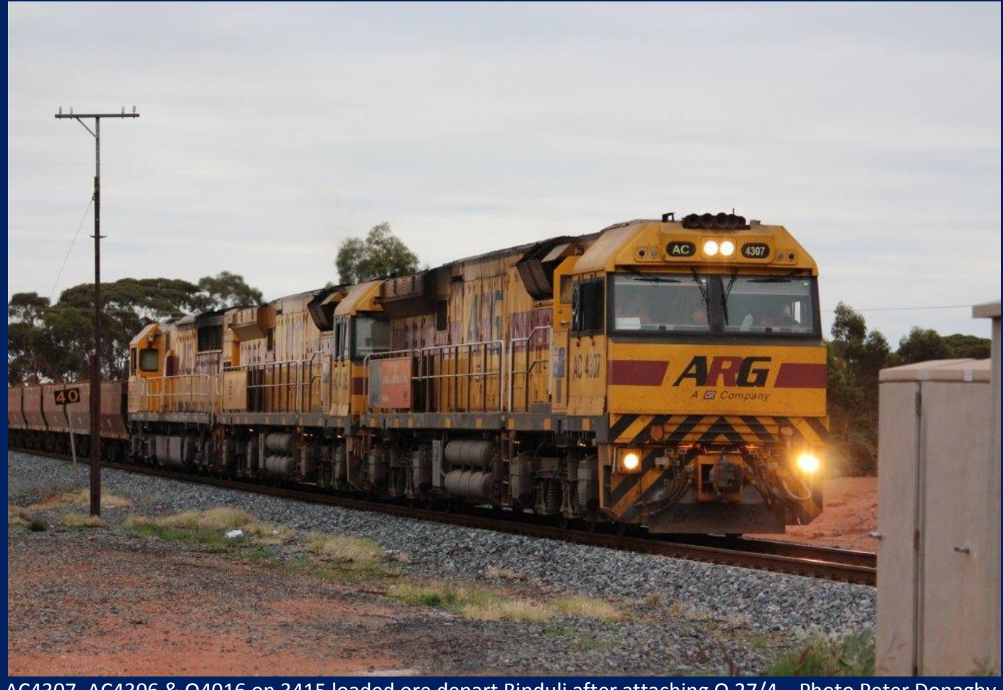
AC4307, AC4306 & Q4016 on 3415 loaded ore depart Binduli after attaching Q 27/4.