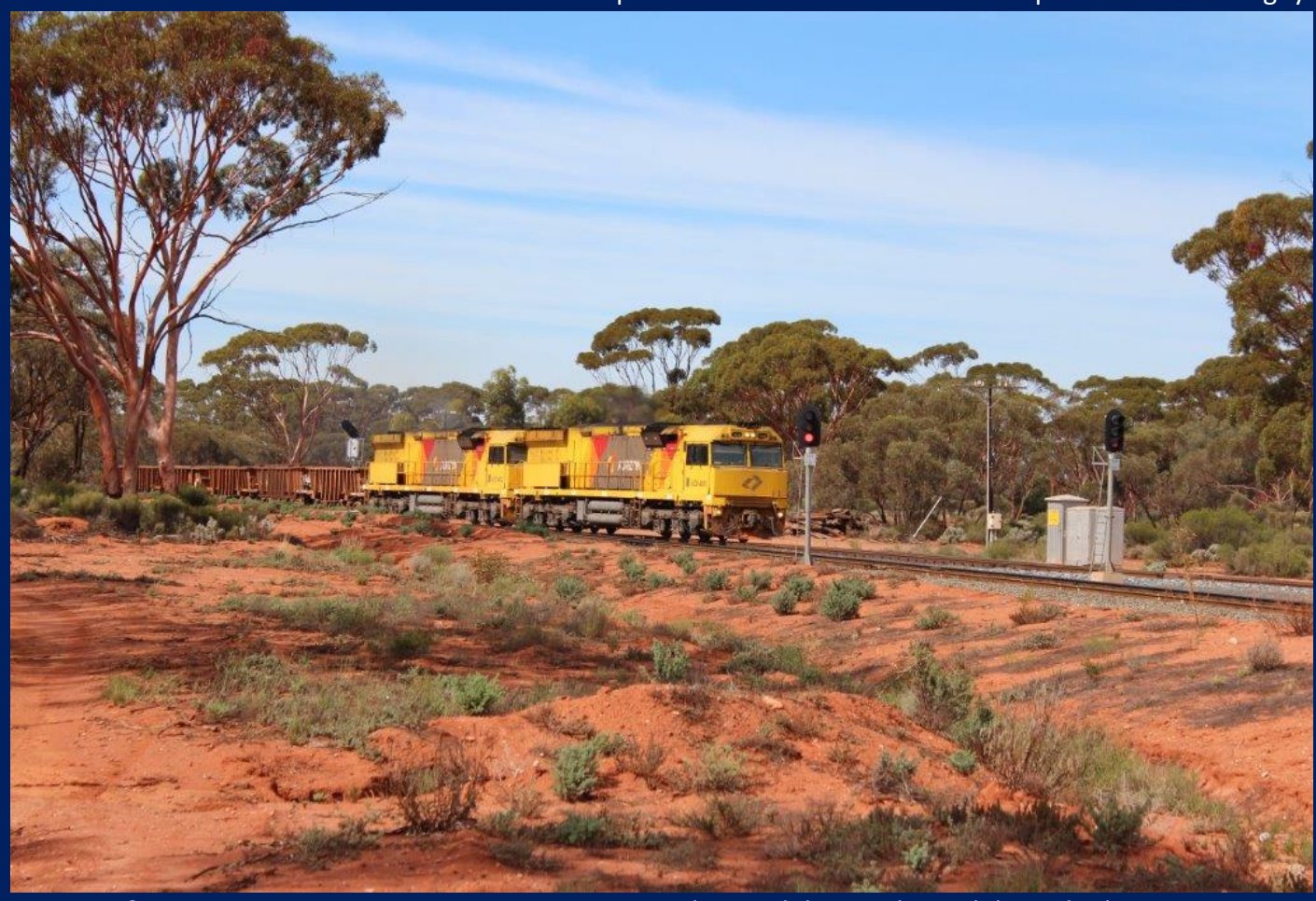
ACB4404 & ACB4402 run 6416 empty ore on to western leg Binduli triangle Binduli April 4th.