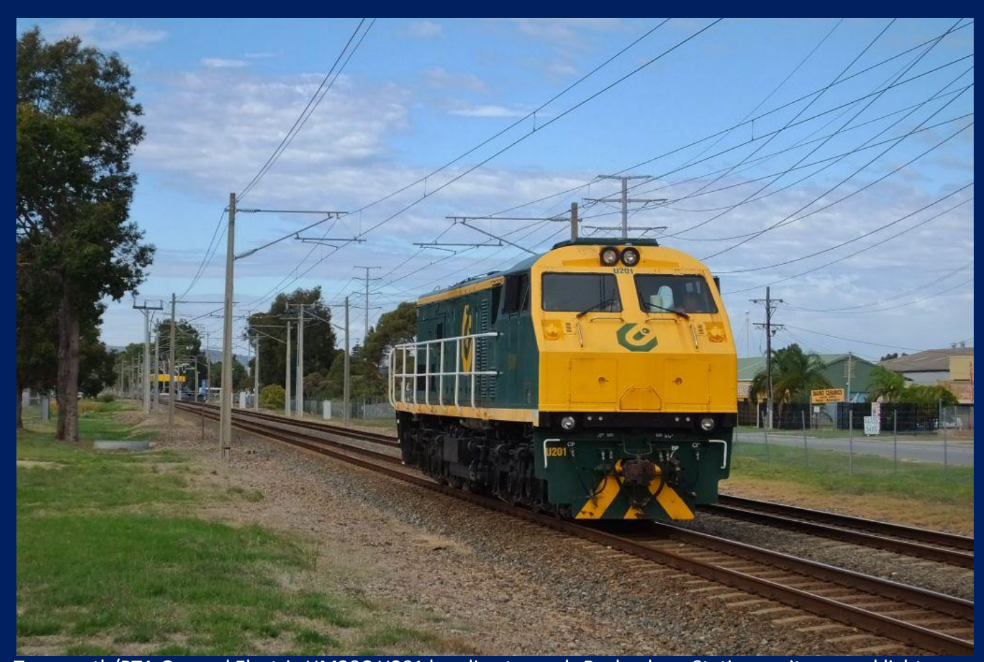
Transperth/PTA General Electric UM20C U201 heading towards Beckenham Station on its second light engine trial from Claisebrook to Armadale and return at Cannington April 30th.