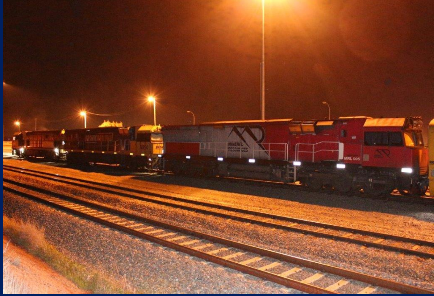
NR37, NR54 & dead attached MRL005 on 7PX4 at West Kalgoorlie April 18th.