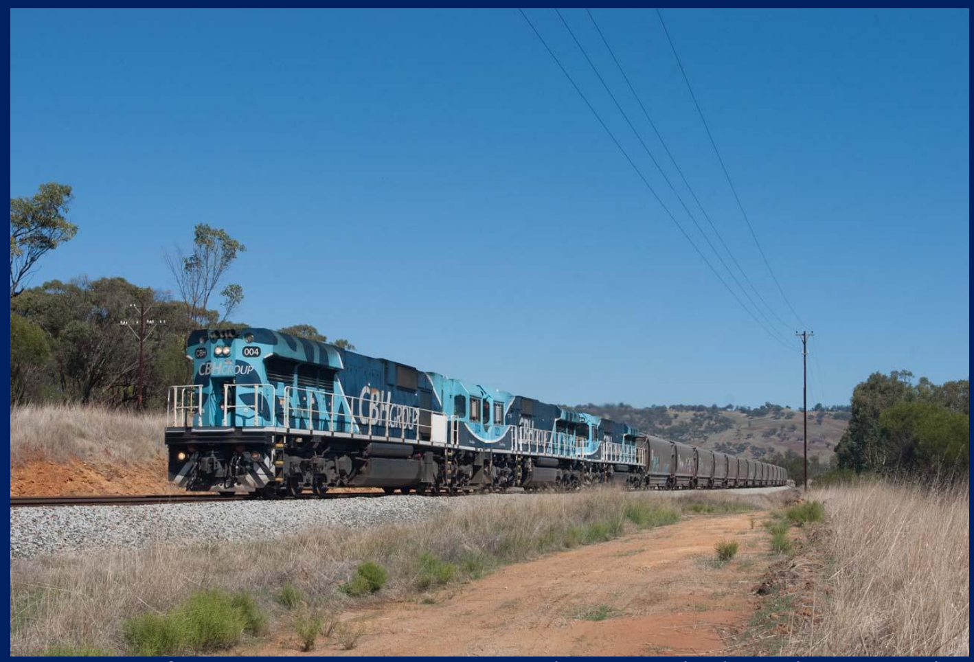
CBH004, CBH023 & CBH024 on 6K05 empty Watco grain Toodyay West April 17th.