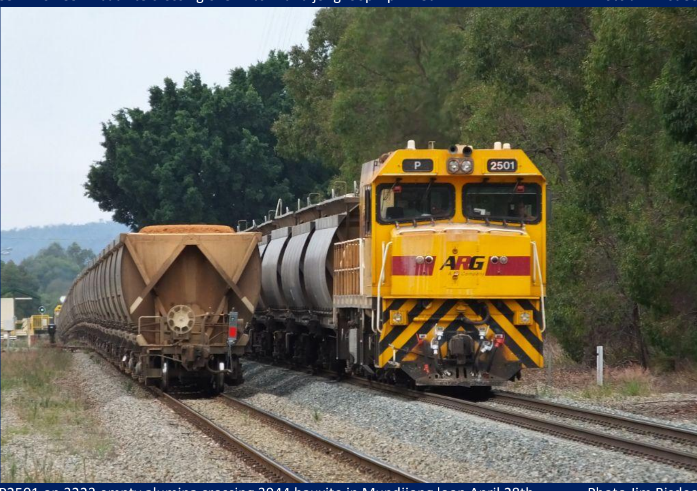
P2501 on 3223 empty alumina crossing 3944 bauxite in Mundijong loop April 28th.