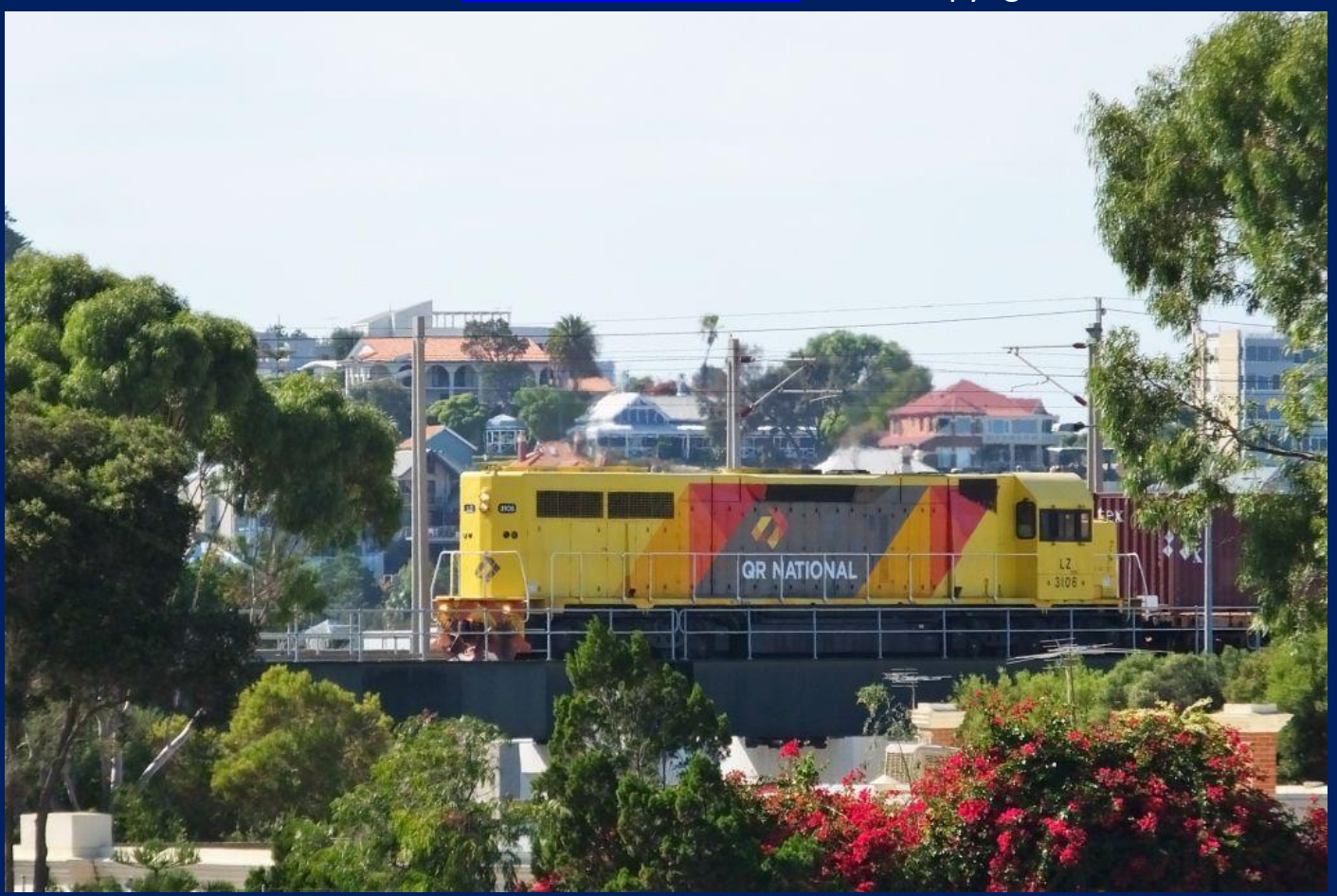
LZ3106 on final 4196 lead container train crossing Tideman Street Bridge North Fremantle on spur line to North Port container terminal at Port of Fremantle April 1st. Photo Jim Bisdee

Publisher: Jim Bisdee Email: pm1225@bigpond.com Copyright Jim Bisdee © 2015