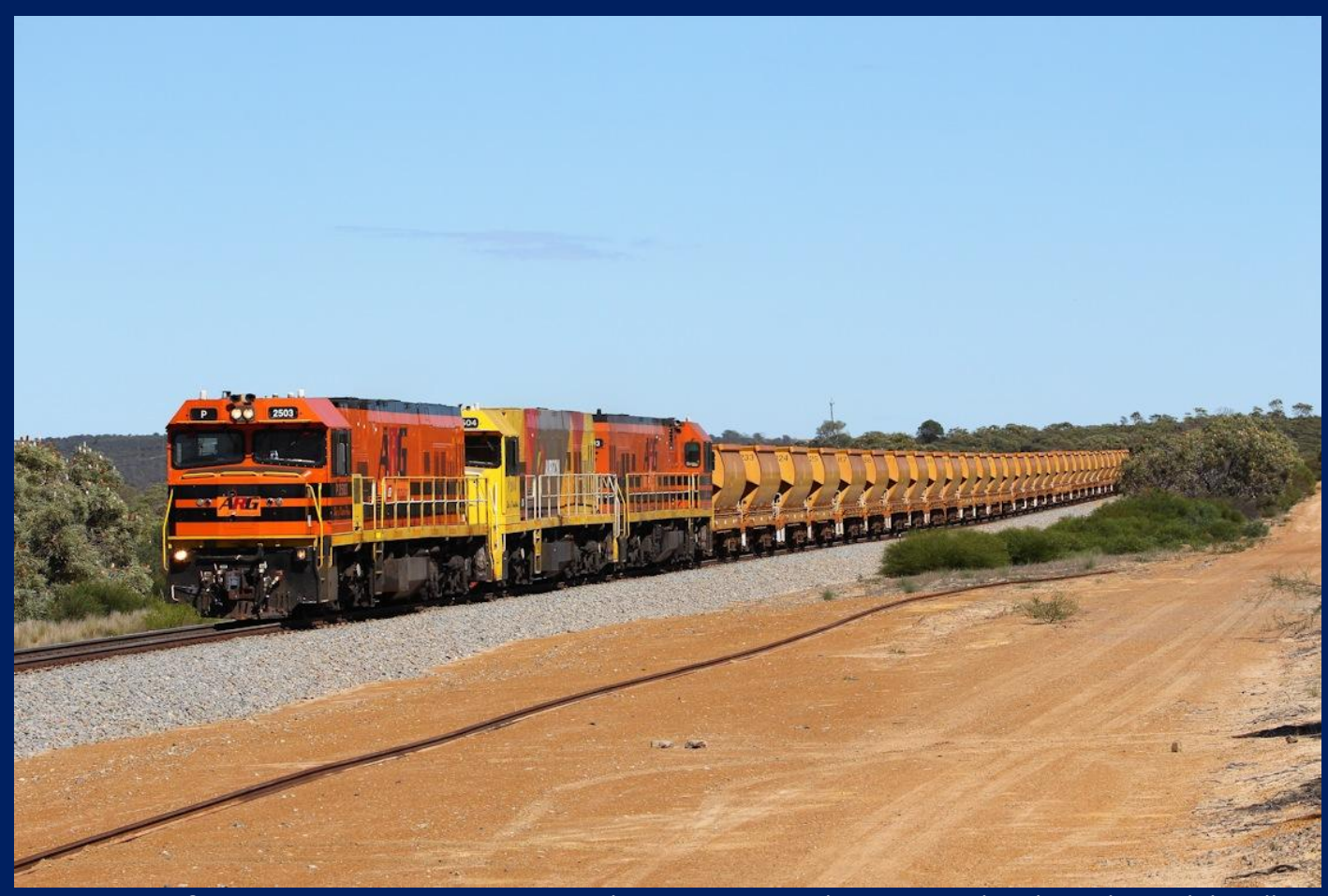
P2503, P2504 & P2513 on 1720 empty ore at Wicherina on run to the mine April 26th.