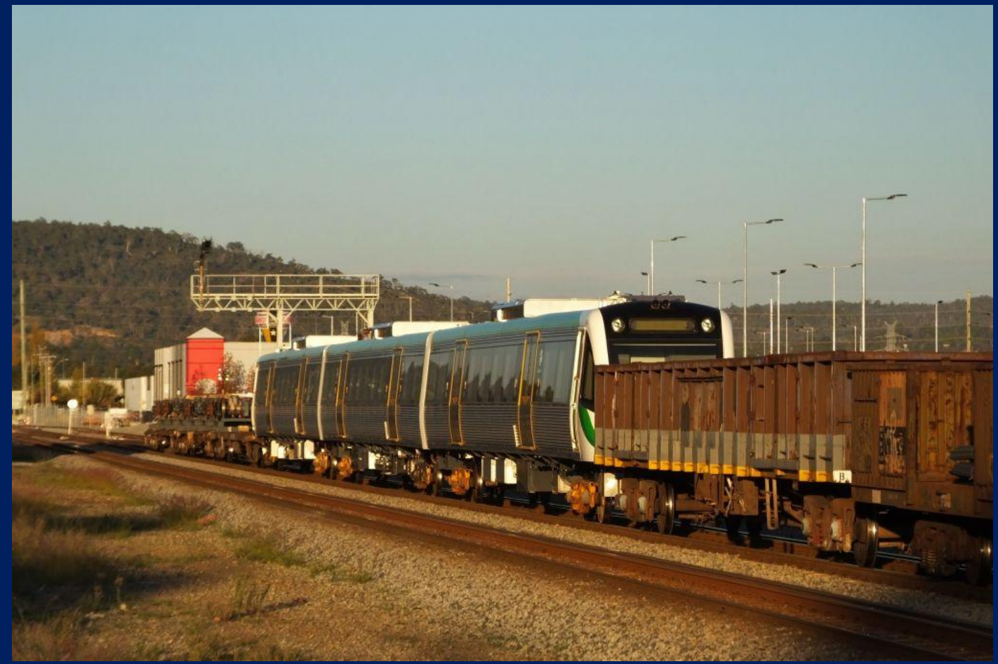
New EMU set 108 being delivered to WA on rear 5MP2 steel at Midland May 31st.