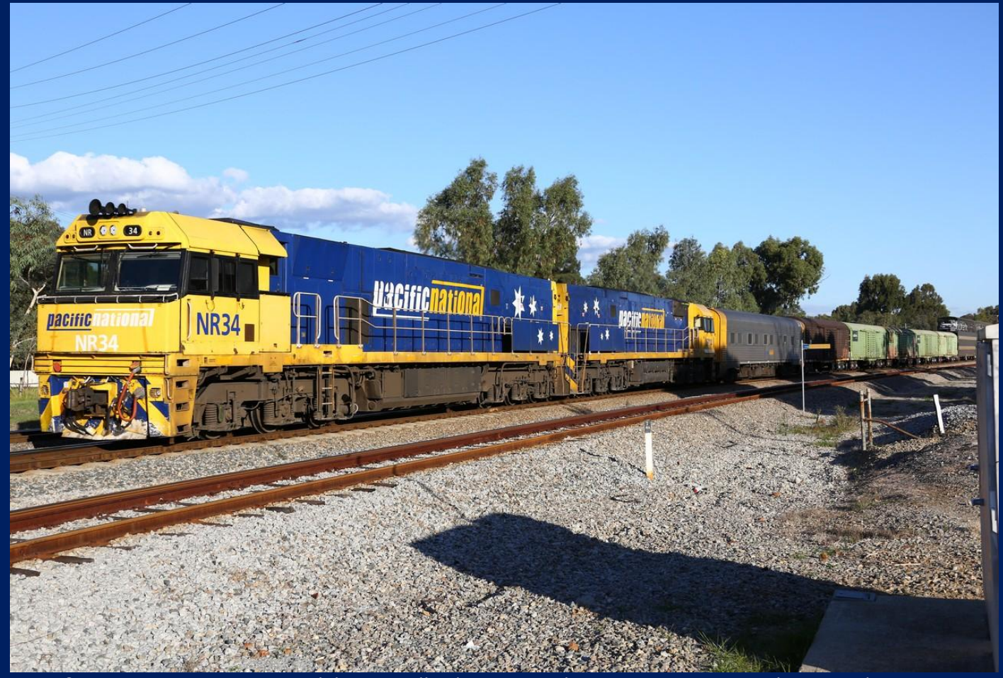
NR34 & NR104 on 7PM5 intermodal at Woodbridge May 30th.