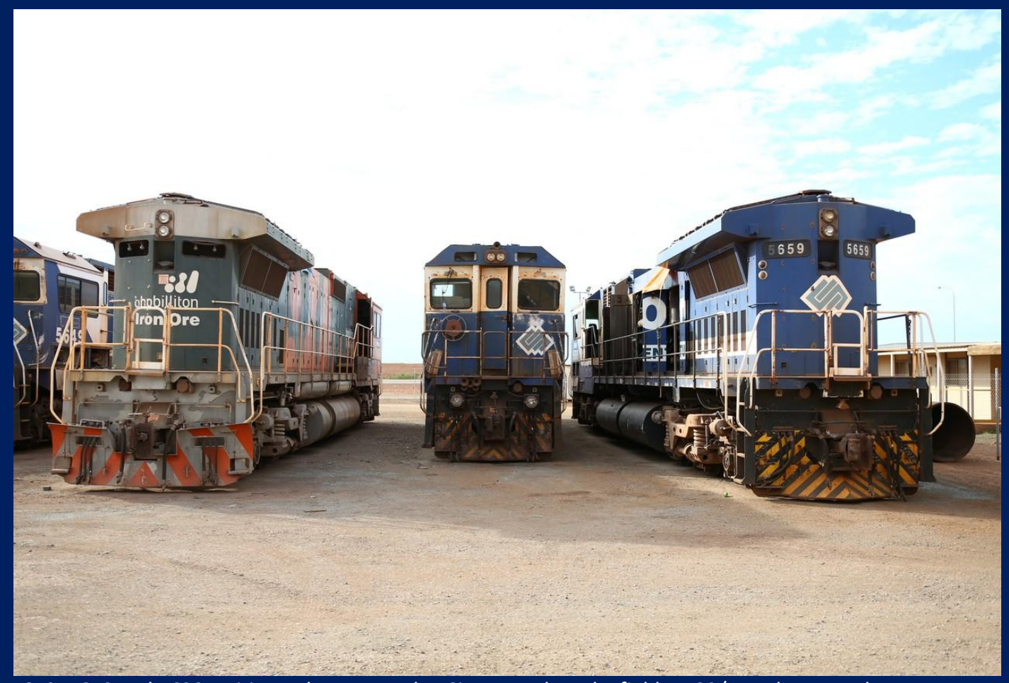
5659, 5640 and 5638 waiting to be scrapped at Sims Metal Wedgefield on 22/5.