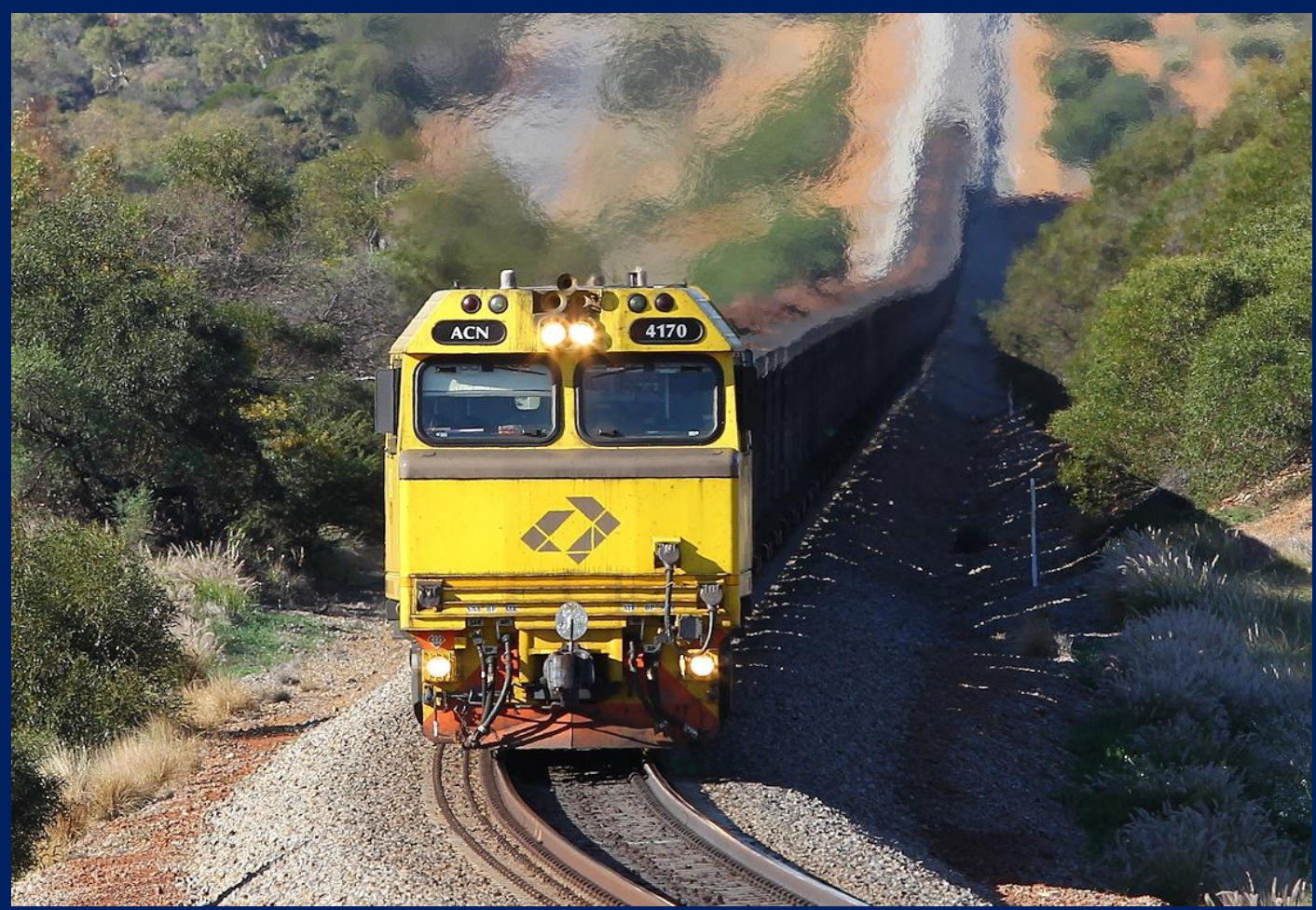
ACN4170 leads loaded Karara ore near Bringo May 31st.