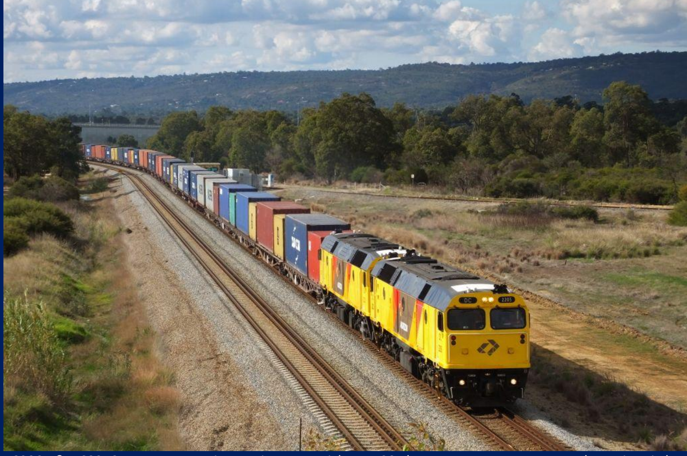
DC2205 & DC2213 on 7144 container train at Kenwick May 23rd.