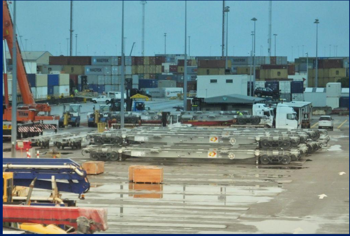
New QQBY skeleton wagons on 12 North Wharf following arrival from China May 18th.