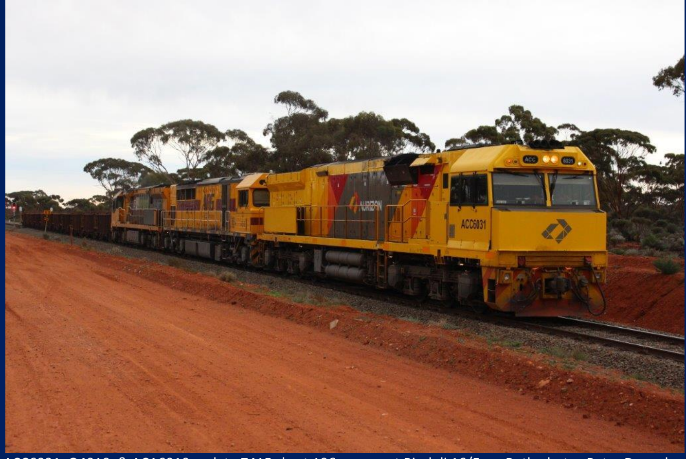
ACC6031, Q4010, & ACA6010 on late 7415 short 106 car ore at Binduli 16/5.