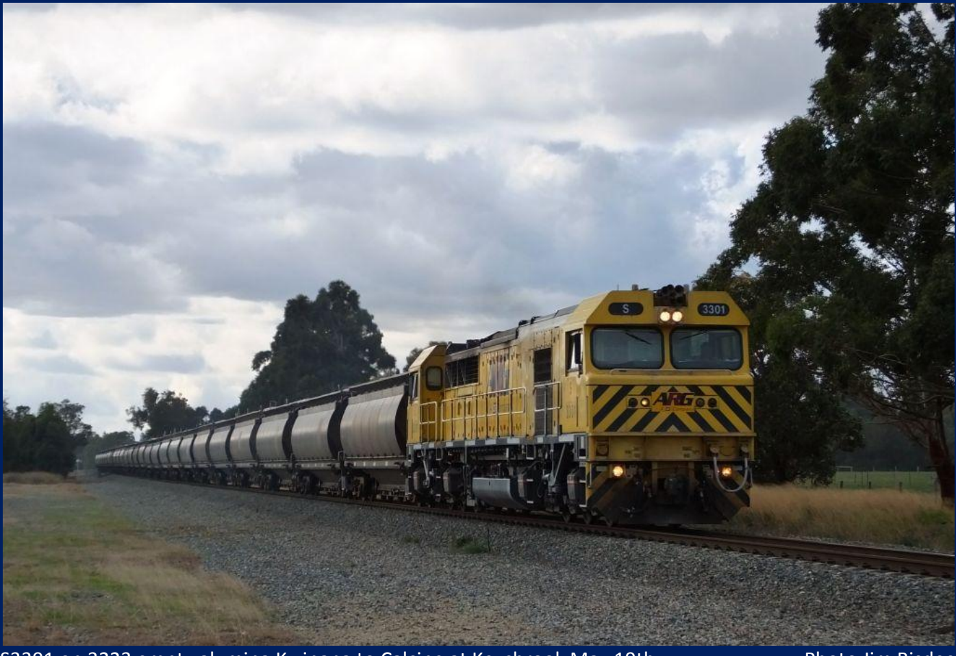
S3301 on 3223 empty alumina Kwinana to Calcine at Keysbrook May 19th.