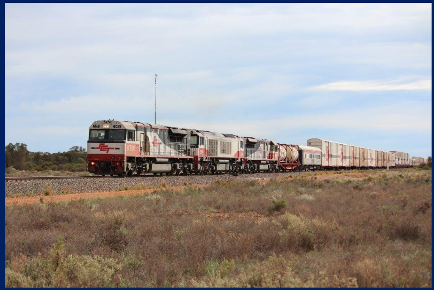
SCT002, CSR008 & SCT010 on late 6PM9 SCT freight rare triple header at Golden Ridge May 16th.