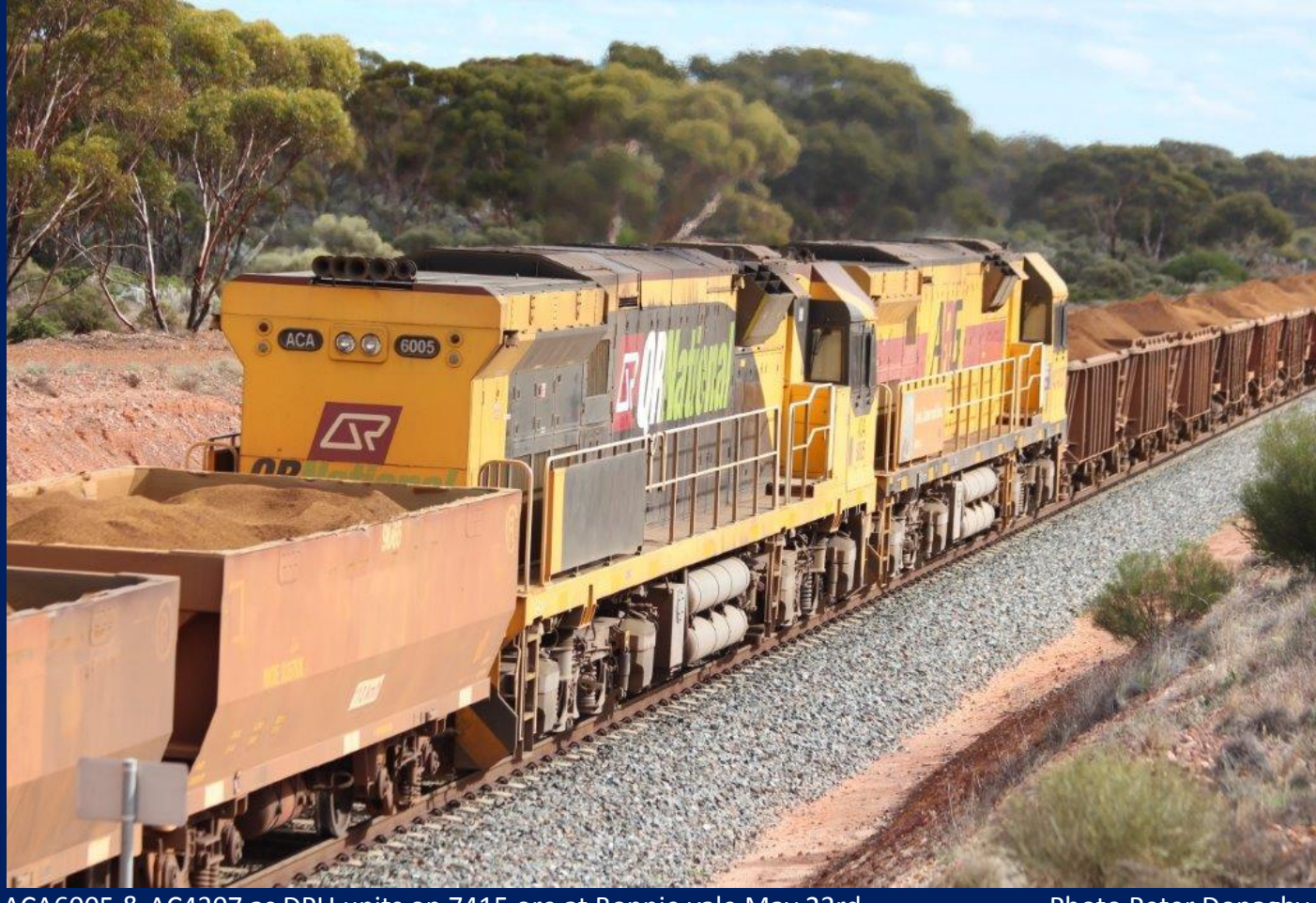
ACA6005 & AC4307 as DPU units on 7415 ore at Bonnie vale May 23rd.