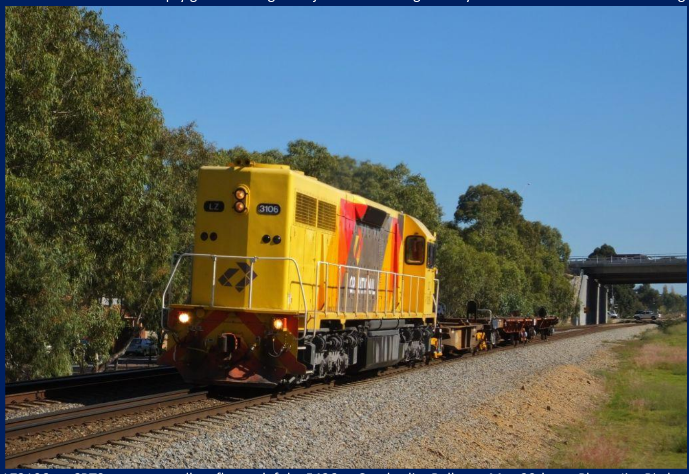
LZ3106 on 6RT9 rescue to collect flattop left by 5426 at Cunderdin, Bellevue May 29th.