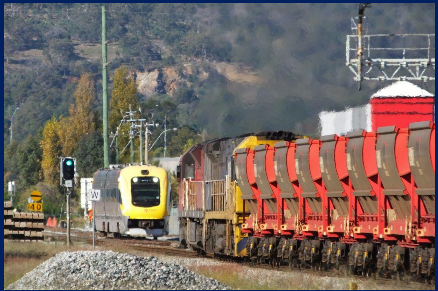
MRL005 & NR95 on 7033 empty Polaris ore cross Prospector railcars at Midalnd 30/5.