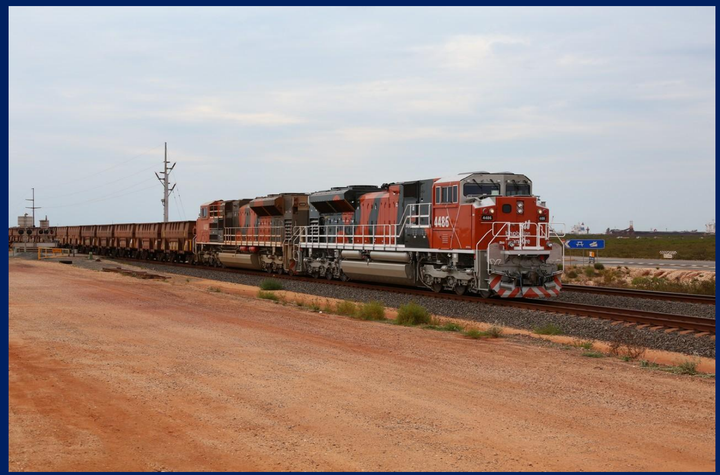
New SD70ACe 4486 & 4459 leads empty ore car rake away from Finucane Island after unloading May 23rd.