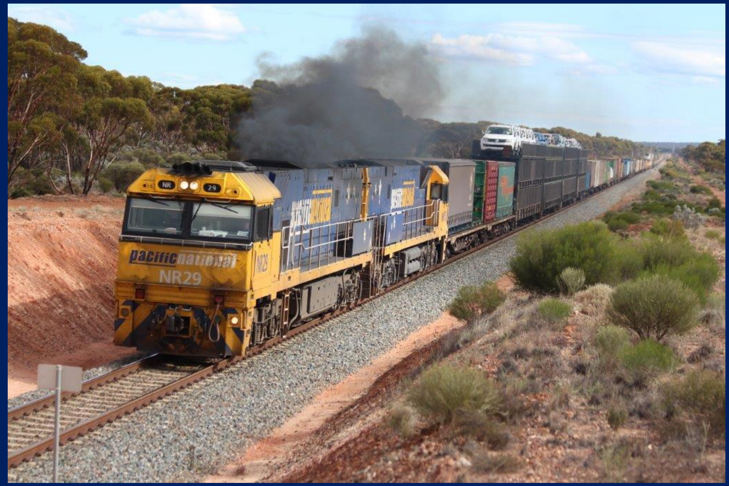
NR29 & NR13 on 6PM6 intermodal at Bonnie Vale May 23rd.