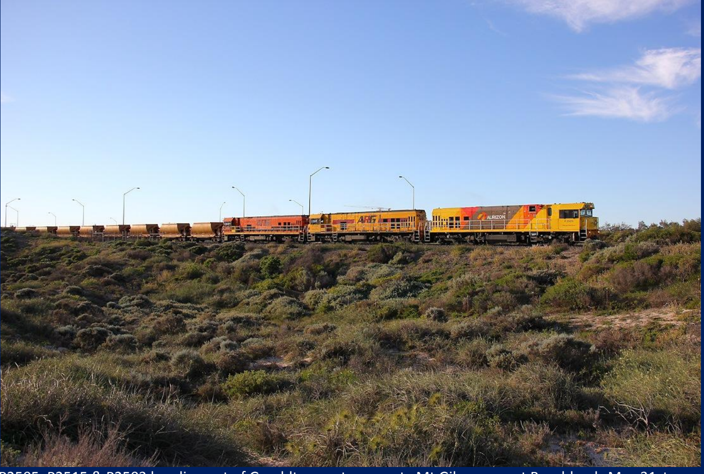
P2505, P2515 & P2503 heading out of Geraldton port on empty Mt Gibson ore at Beachlands May 31st.