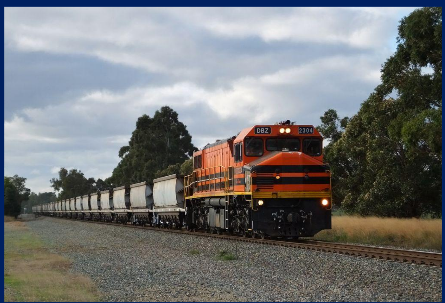
DBZ2304 last DBZ in service on 3253 empty Soundcem coal at Keysbrook May 19th.