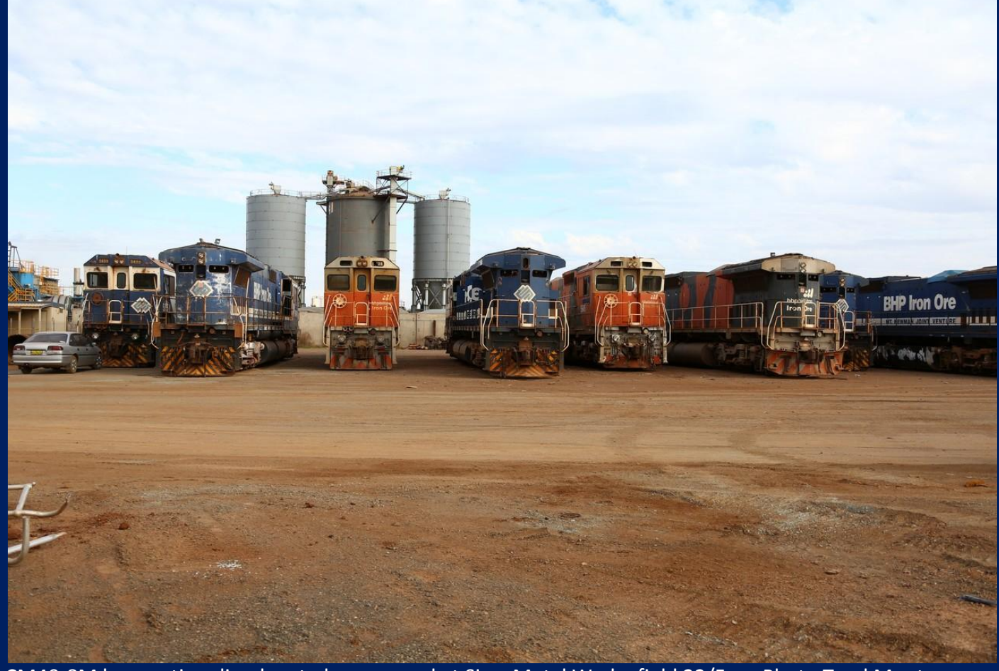
CM40-8M locomotives lined up to be scrapped at Sims Metal Wedgefield 22/5.