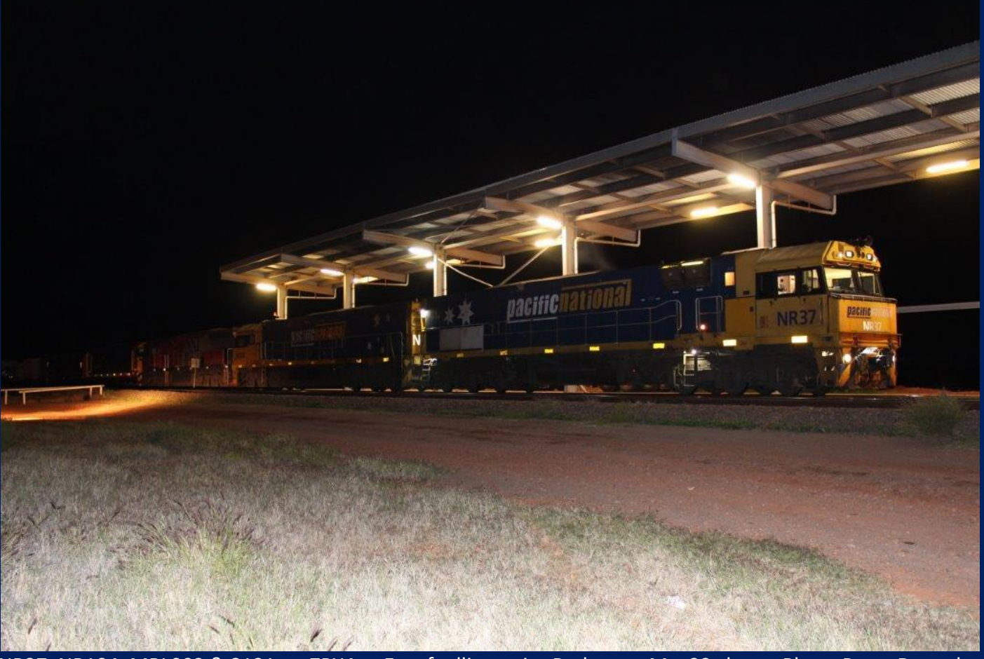
NR37, NR104, MRL002 & 8121 on 7PX4 at East fuelling point Parkeston May23rd.