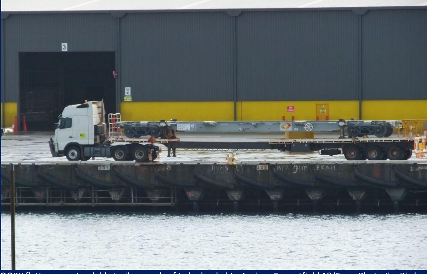
QQBY flattop on extendable trailer on wharf to be hauled to Aurizon Forrestfield 18/5.