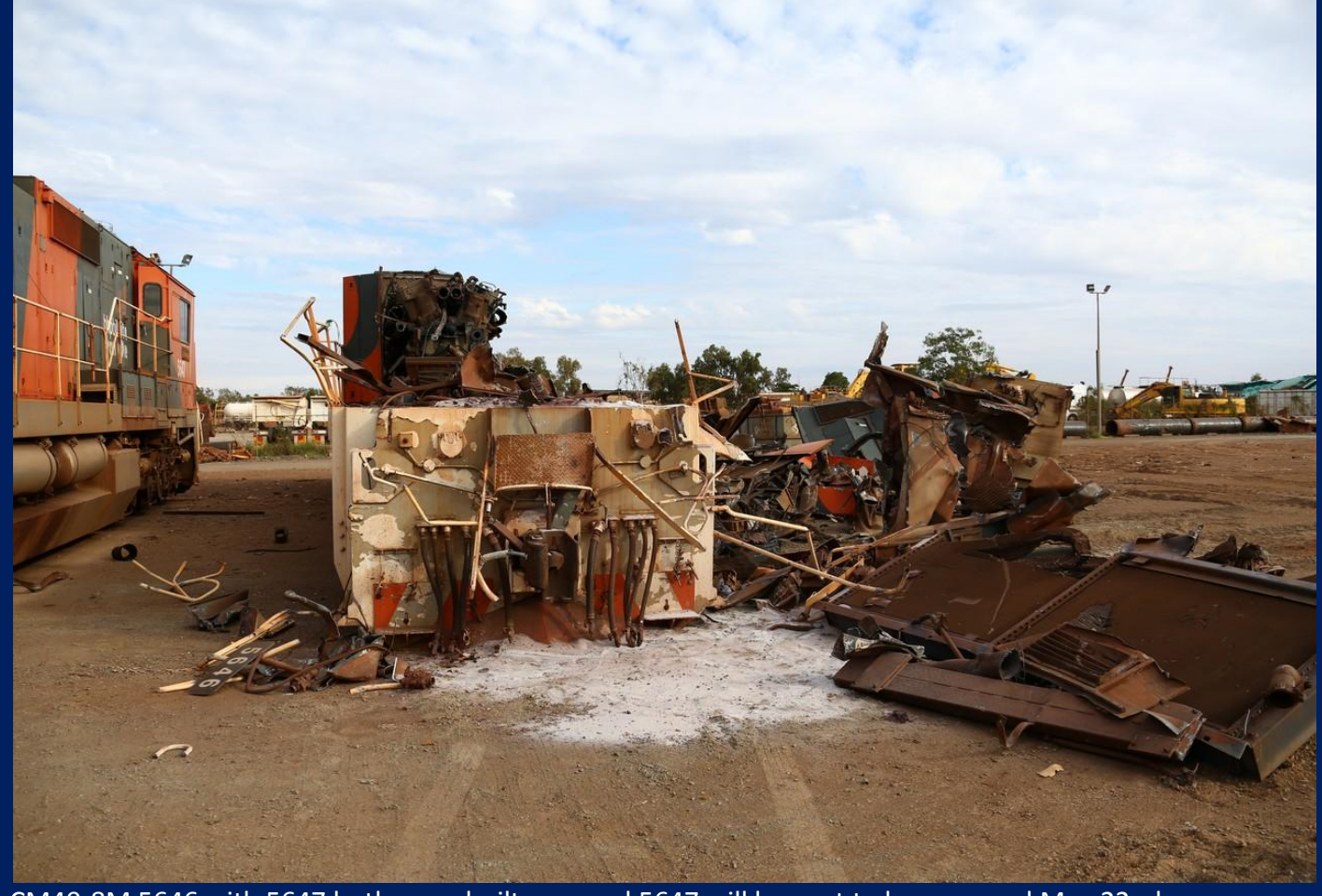
CM40-8M 5646 with 5647 both were built new and 5647 will be next to be scrapped May 22nd.