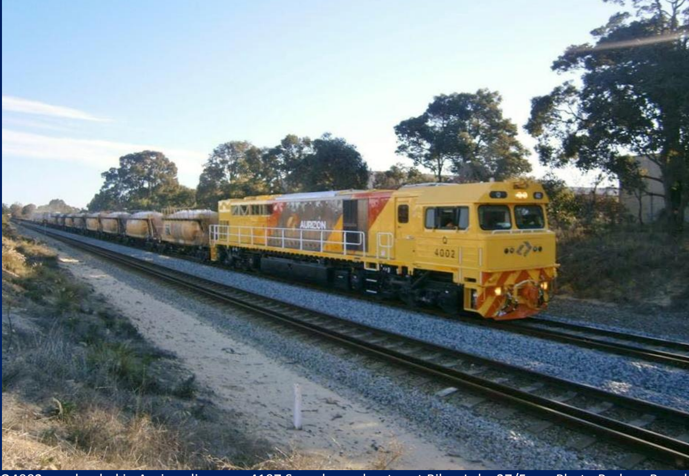
Q4002 overhauled in Aurizon livery on 4197 Soundcem shunter at Bibra Lake 27/5.