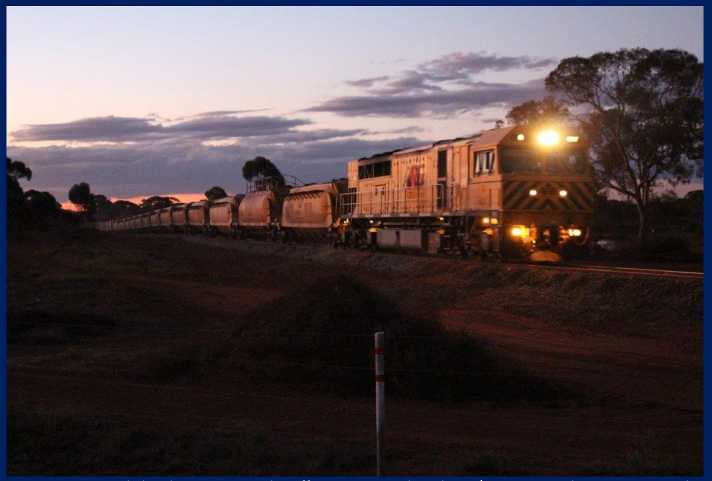
Q4007 on 1478 nickel with new rare earth traffic on rear at Kalgoorlie 24/5.