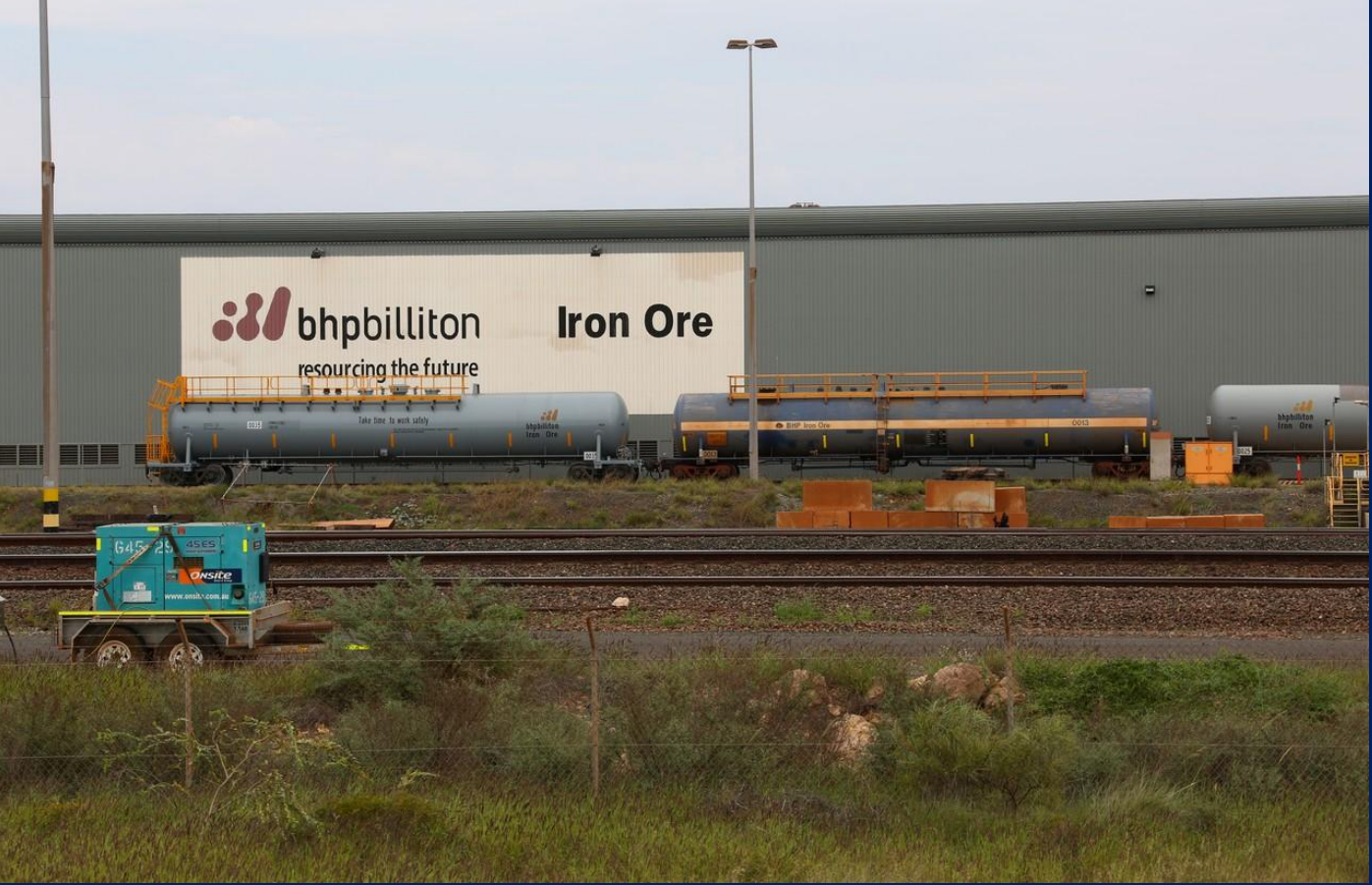
New style and old style BHPBIO fuel tankers at Nelson Point May 23rd.