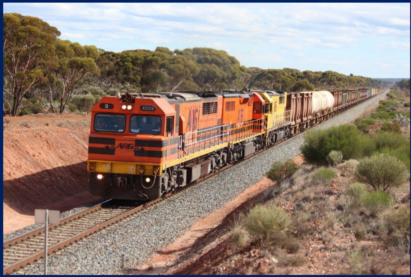
Q4009, LZ3117 & failed Q4007 on 6029 sulphur at Bonnie Vale May 23rd.