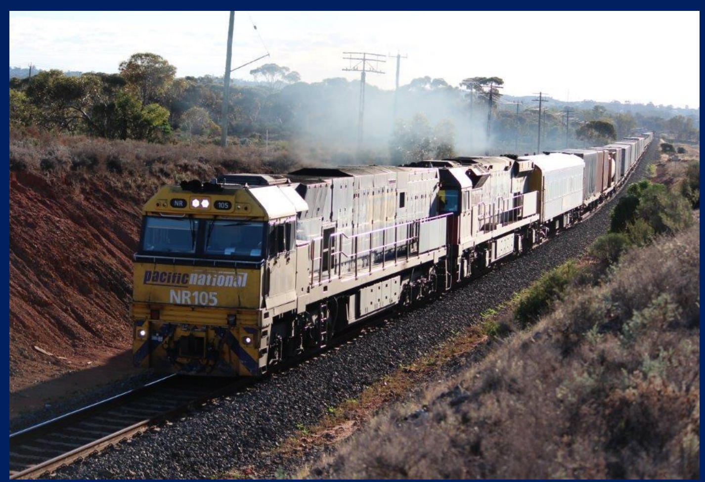
NR105 & MRL006 returning to WA on 5MP2 at West Kalgoorlie May 24th.