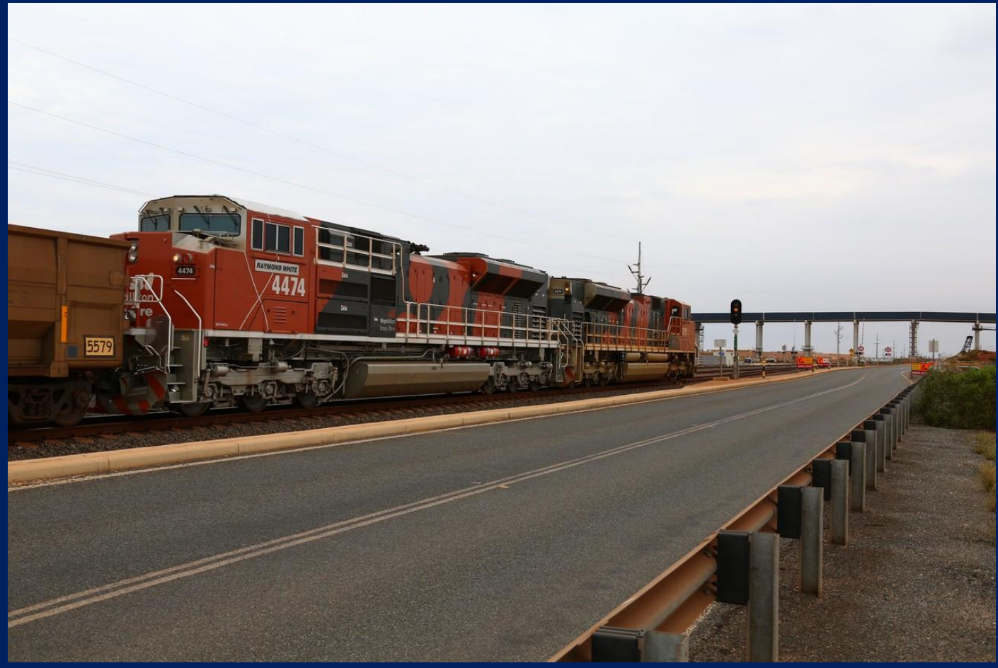
4474 named "Raymond White" after loco driver behind 4379 on empty car rake departing Finucane Island with new Roy Hill conveyor in background May 23rd.