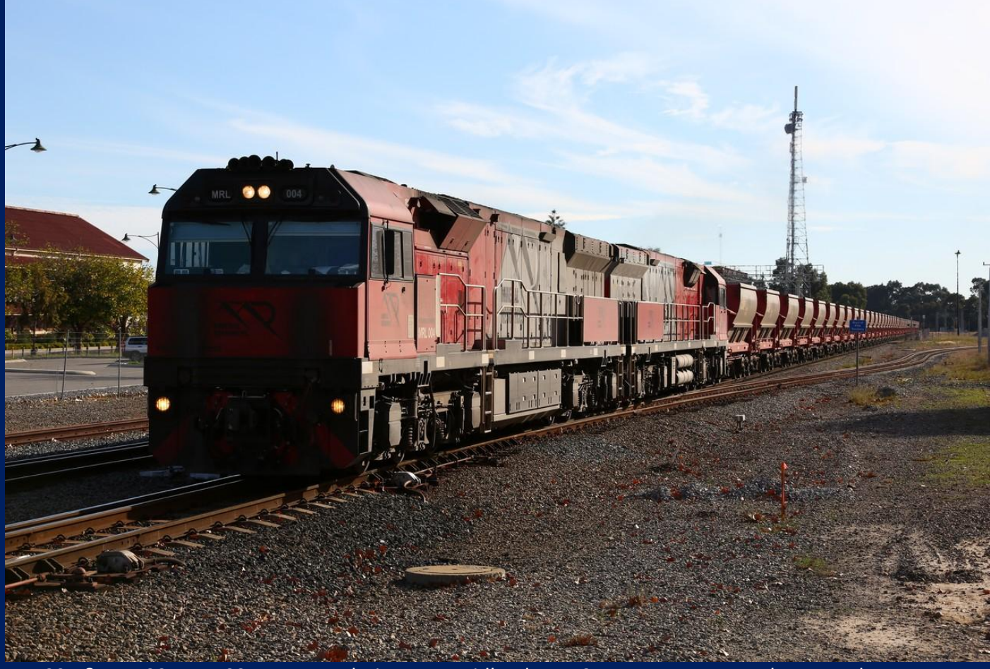
MRL004 & MRL001 on 1035 empty Polaris ore at Midland May 31st.