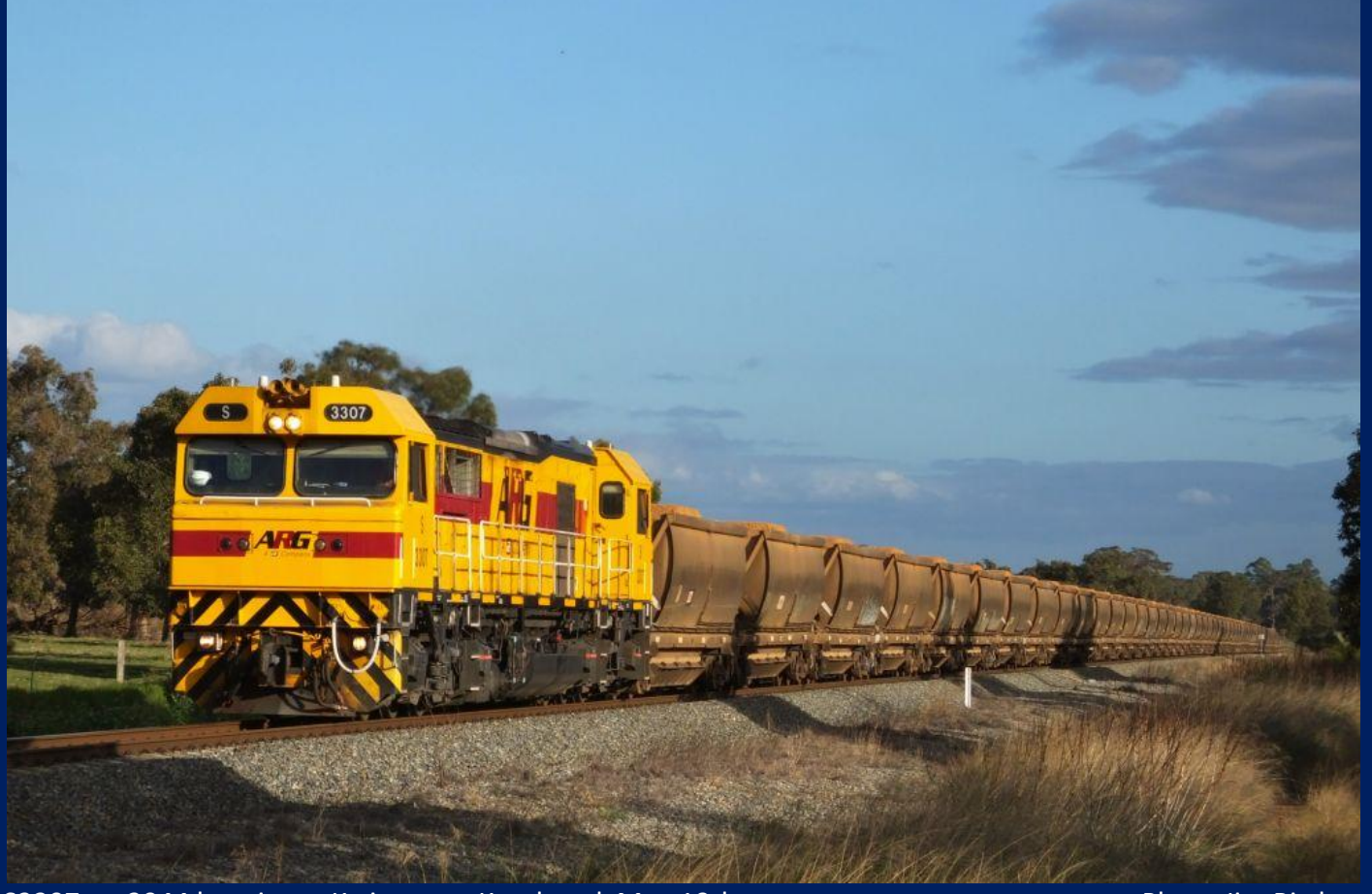
S3307 on 3944 bauxite to Kwinana at Keysbrook May 19th.