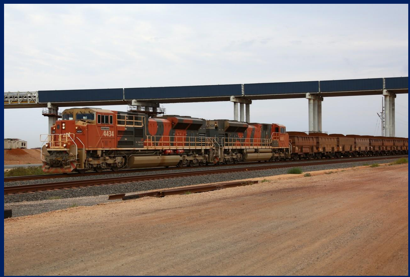
4434 & 4435 run loaded rake under Roy Hill conveyor Finucane Island 23/5.