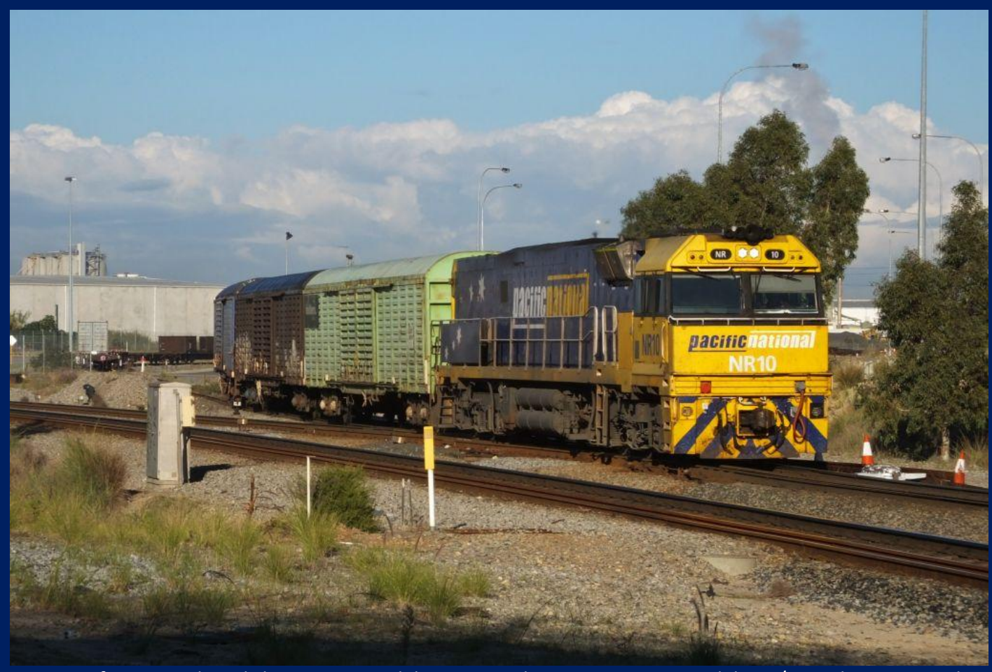
NR10 Pacific National Yard shunter at Kewdale on 7P51 shunter entering Kewdale 23/5.