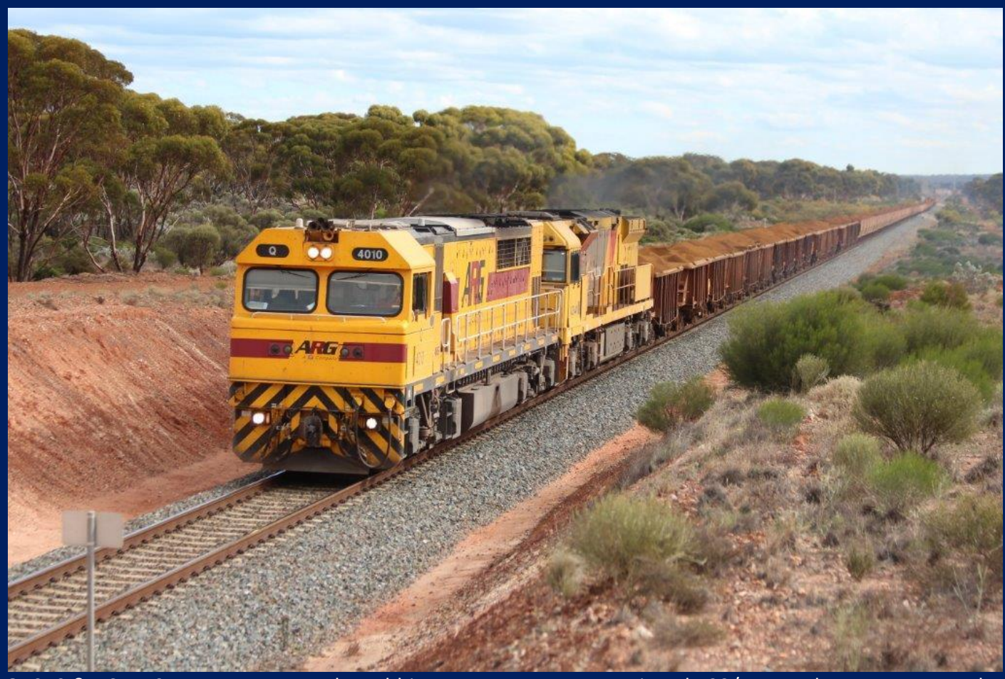
Q4010 & ACB4401 on 7415 ore Koolyanobbing to Esperance at Bonnie Vale 23/5. Photo Peter Donaghy