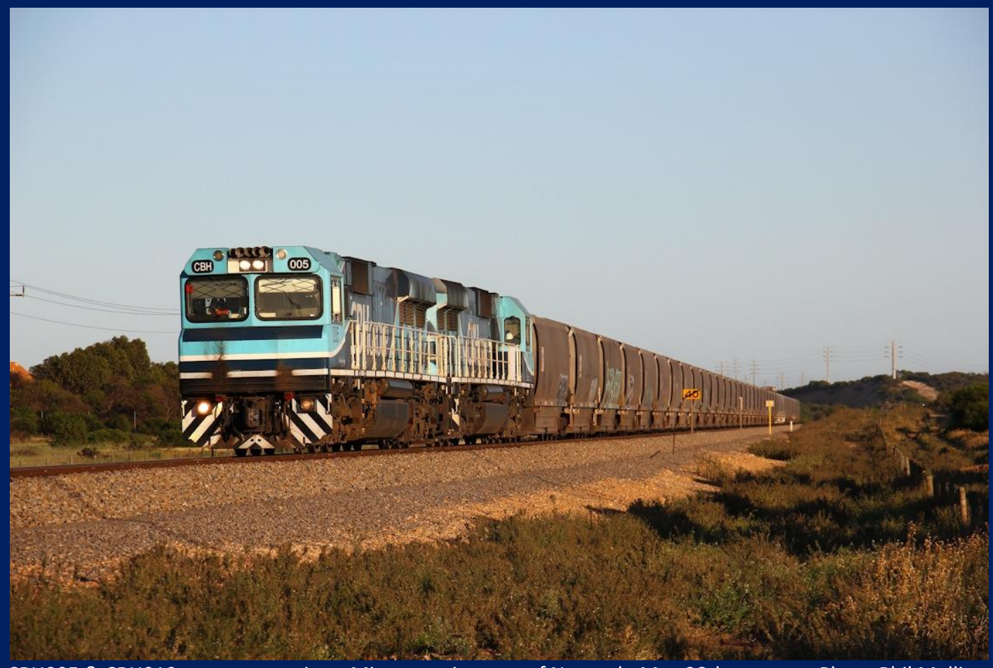
CBH005 & CBH010 on empty grain to Mingenew just out of Narngulu May 28th.