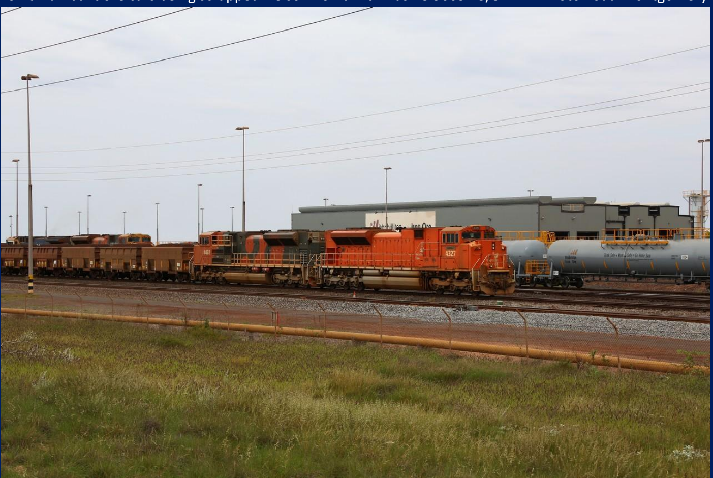
Ex BNSF Pumpkin SD70ACe 4327 leads 4402 on ore in Nelson Point yard 23/5.