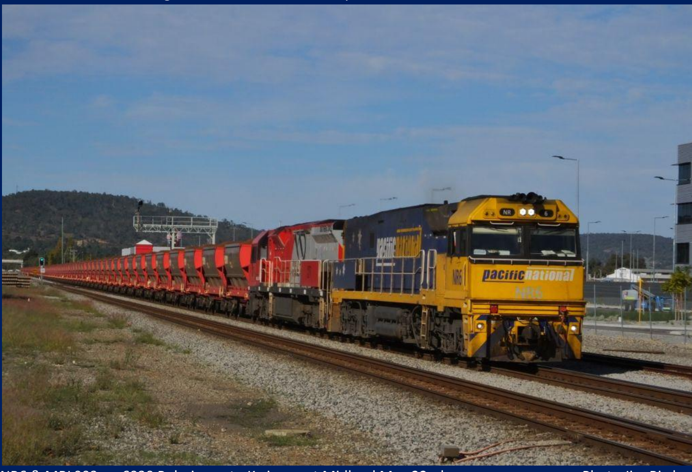
NR6 & MRL003 on 6030 Polaris ore to Kwinana at Midland May 22nd.