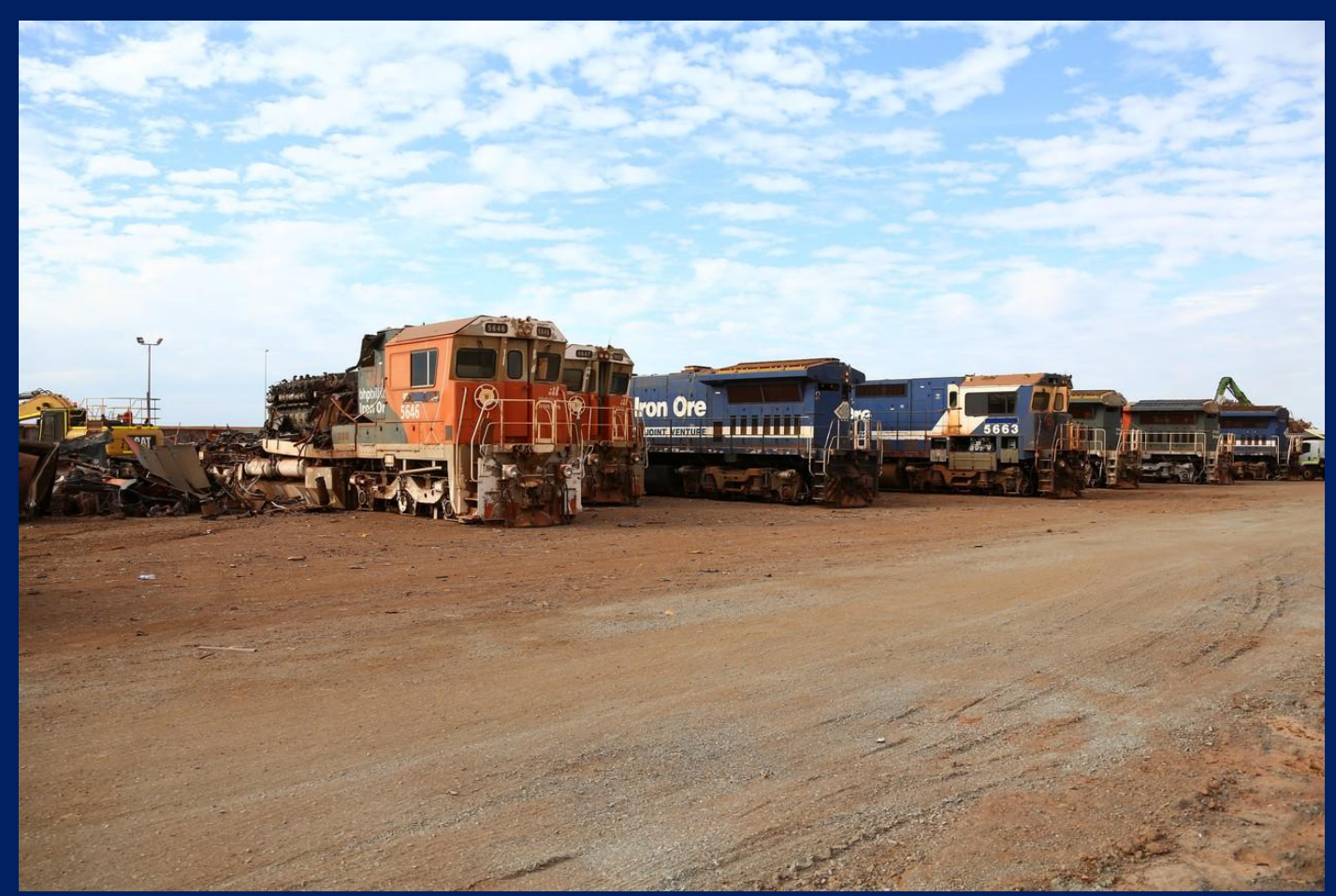
CM40-8M locomotives to be scrapped at Sims Metal Wedgefield May 22nd.