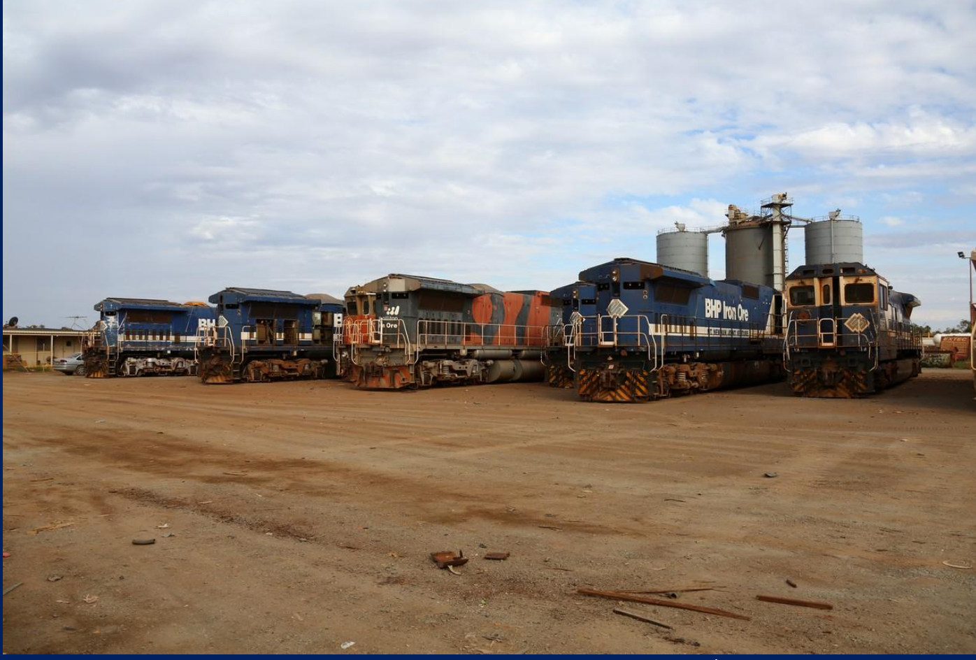
Rebuilt on the Alco frames BHPIO CM40-8M locomotives waiting scrapping 22/5.