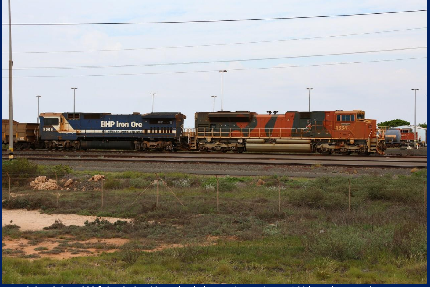
BHPBIO CM40-8M 5666 & SD70ACe 4334 on loaded ore Nelson Point Yard 23/5.