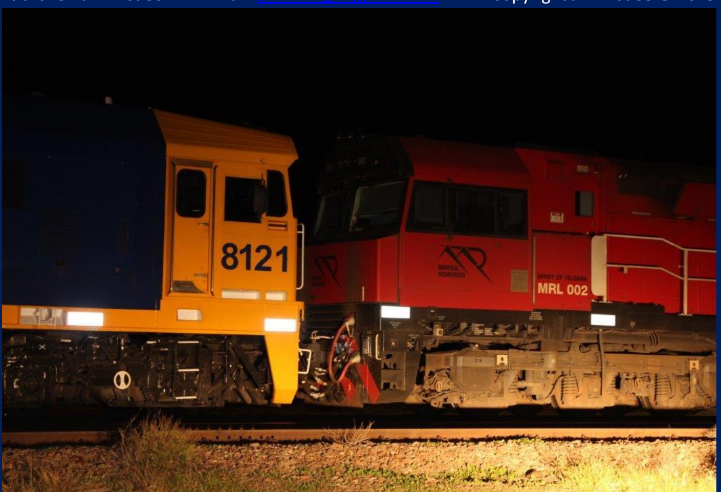
8121 & MRL002 nose to nose on 7PX4 at Parkeston, road locos are refuelling 23/5. Photo Peter Donaghy

Publisher: Jim Bisdee Email: <a href="mailto:pm1225@bigpond.com">pm1225@bigpond.com</a> Copyright Jim Bisdee © 2015