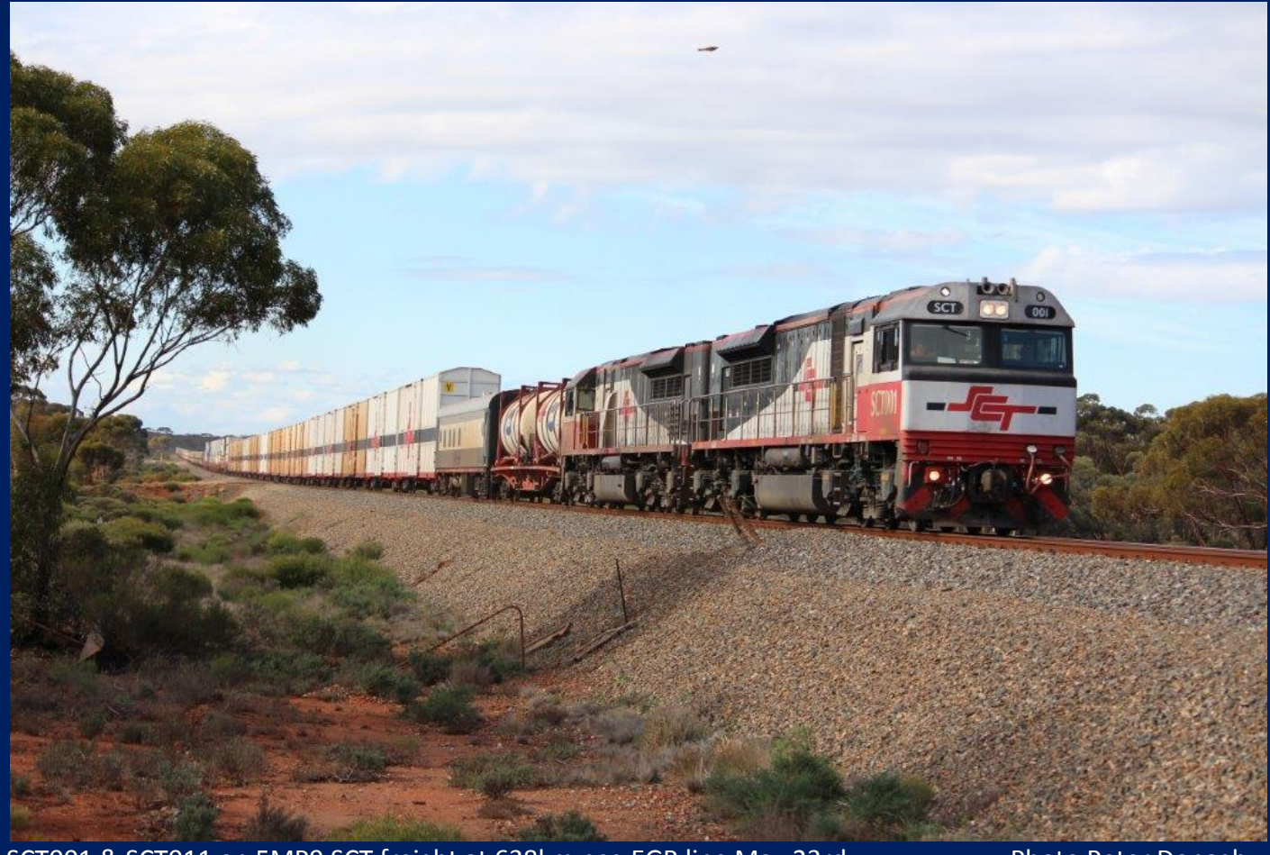
SCT001 & SCT011 on 5MP9 SCT freight at 638km peg EGR line May 23rd.