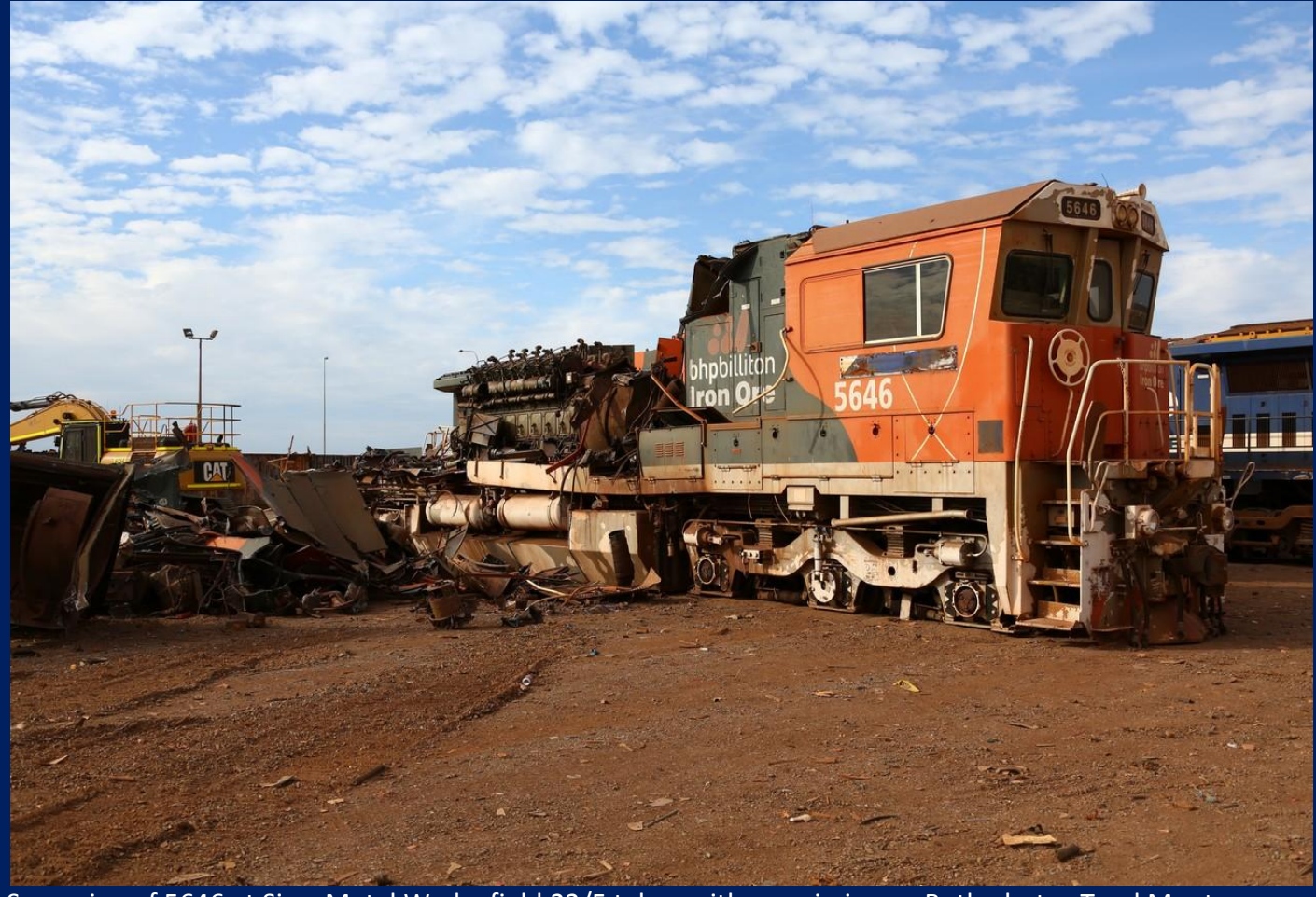
Scrapping of 5646 at Sims Metal Wedgefield 22/5 taken with permission.