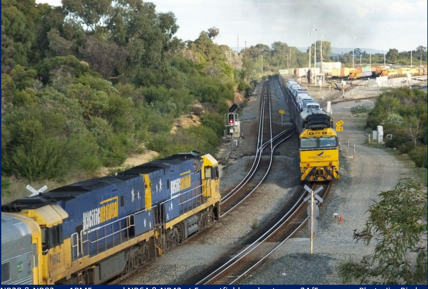
NR28 & NR82 on 1PM5 crossed NR64 & NR42 at Forrestfield yard entrance 24/5.