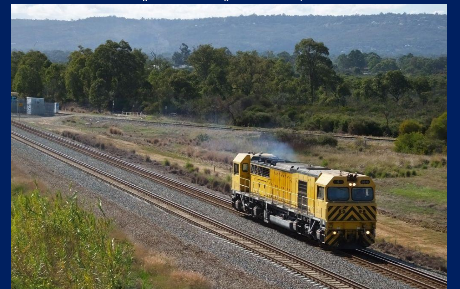
S3310 on 1172 light engine Forrestfield to Kwinana at Kenwick May 24th.