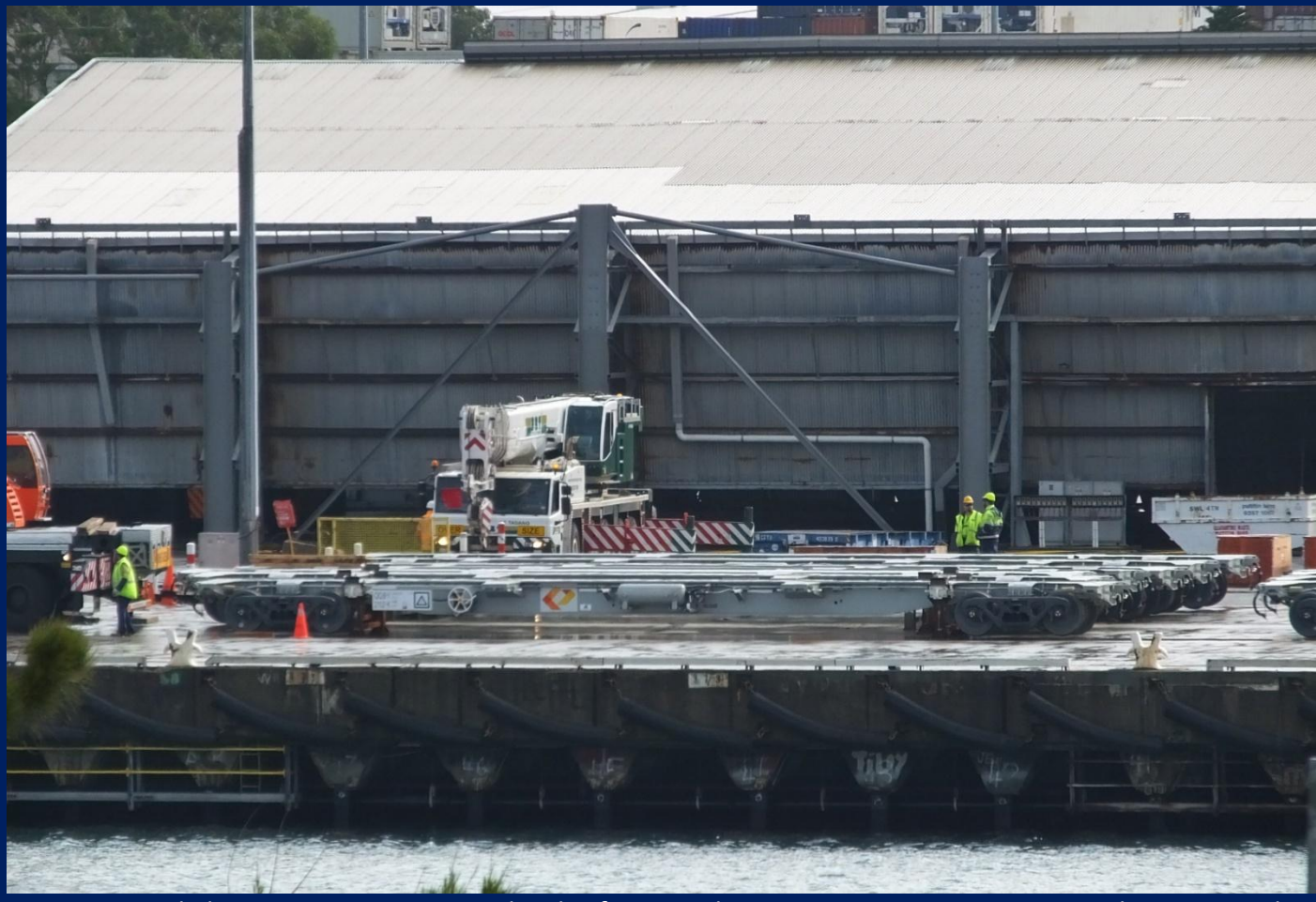
New Aurizon skeleton wagons on 12 North Wharf May 18th.