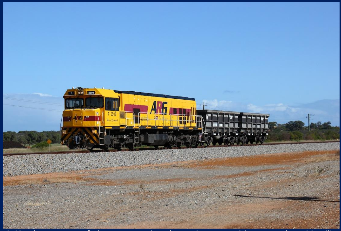
P2508 on loco wagon transfer between Narngulu and Narngulu East May 18th.