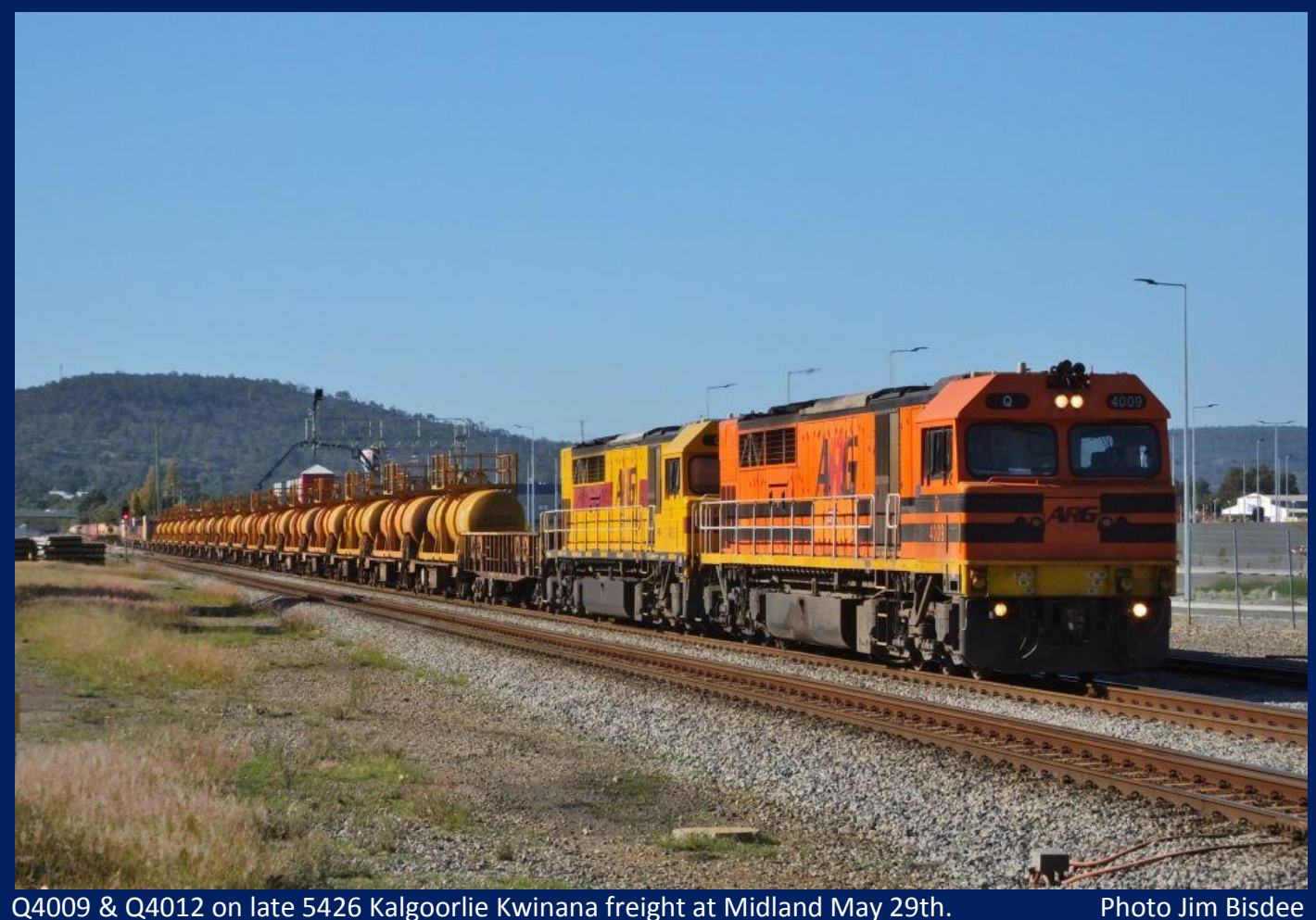
Q4009 & Q4012 on late 5426 Kalgoorlie Kwinana freight at Midland May 29th.