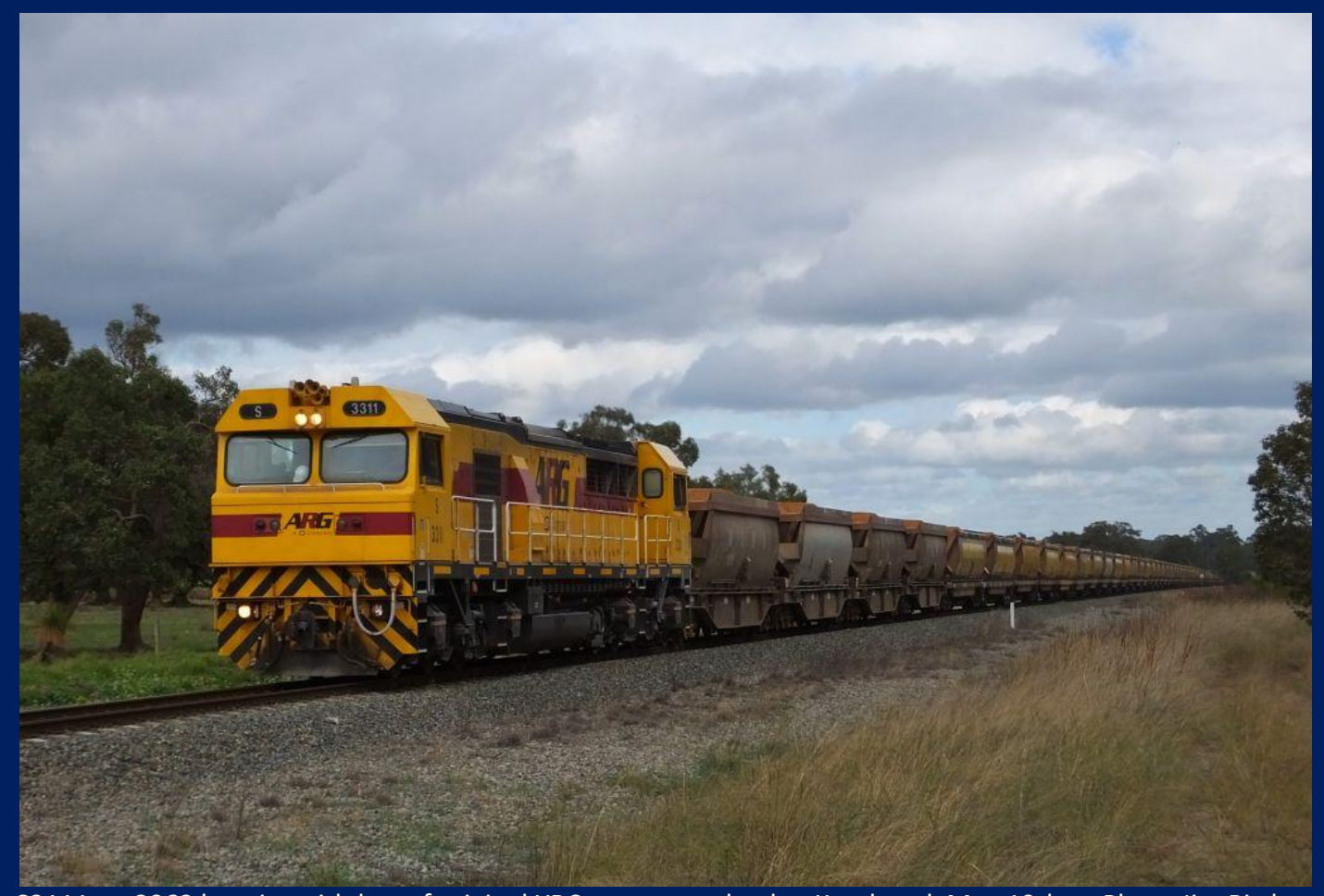
S3111 on 3962 bauxite with last of original XBC wagons on lead at Keysbrook May 19th.