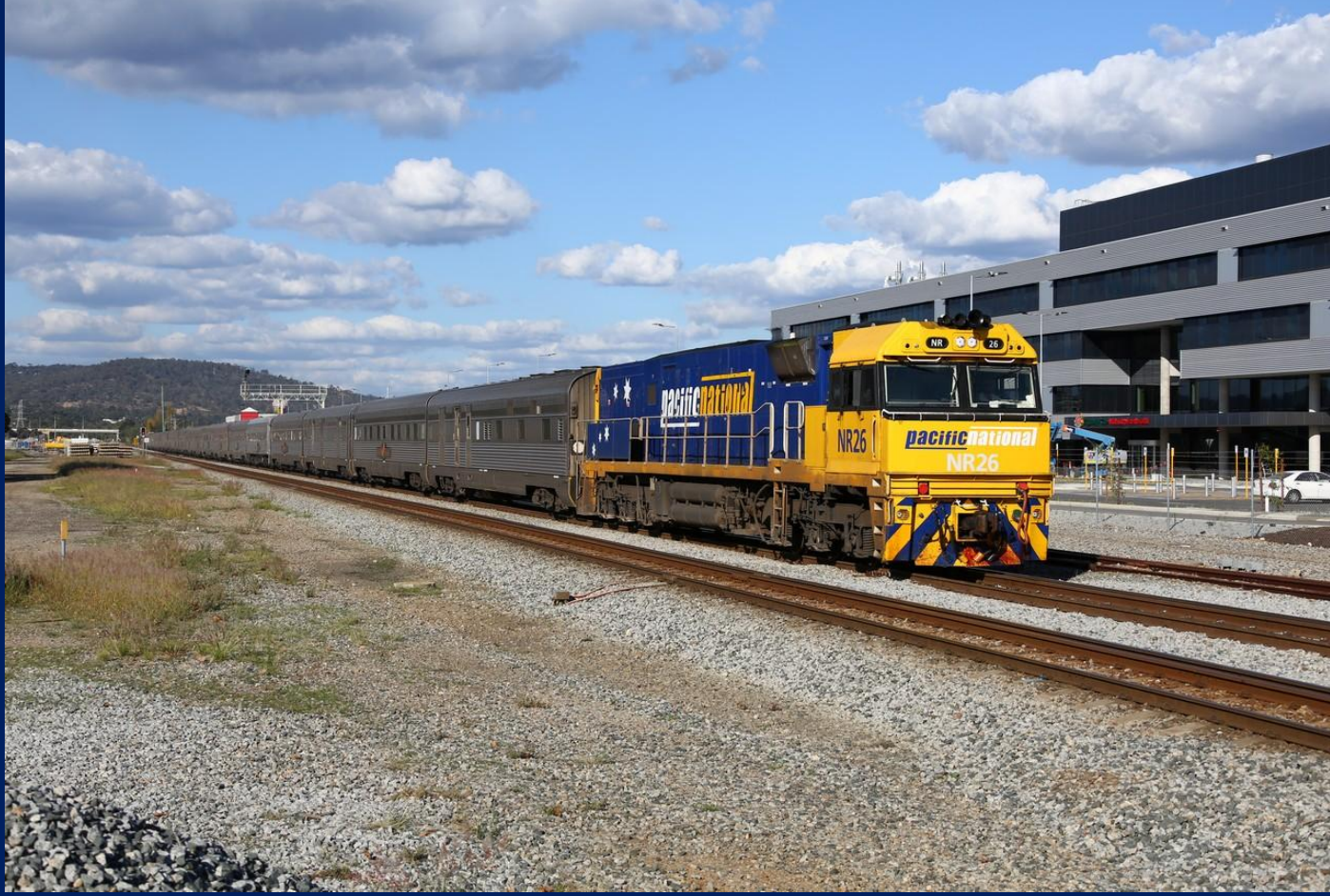
NR26 on 5AP8 Indian Pacific at Midland passing new hospital May 30th.