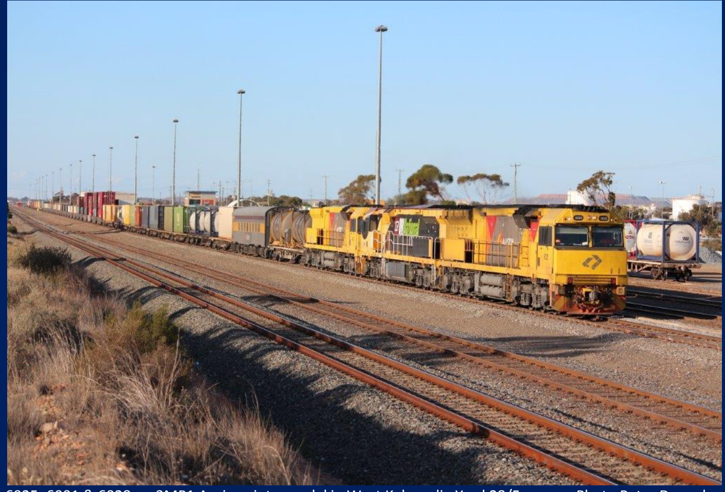
6025, 6001 & 6028 on 3MP1 Aurizon intermodal in West Kalgoorlie Yard 28/5.