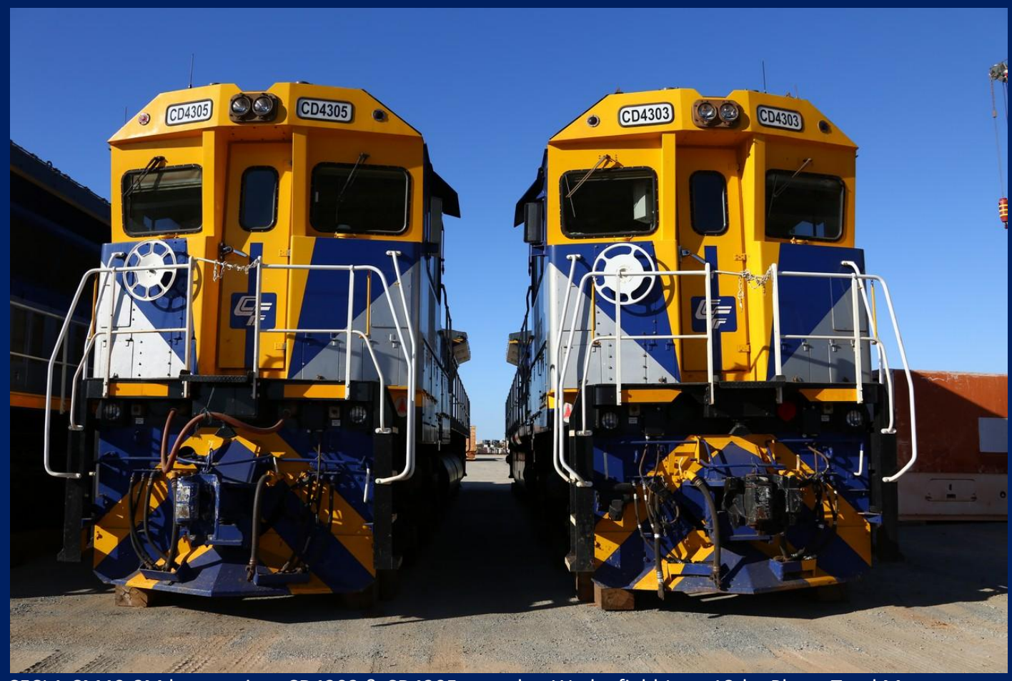
CFCLA CM40-8M locomotives CD4303 & CD4305 stored at Wedgefield June 18th.