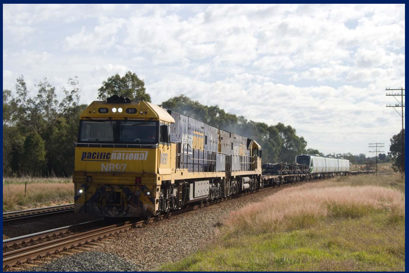
NR97 & NR76 on 3P32 with EMU set 107 at Middle Swan after running round at Jumperkine June 5th.