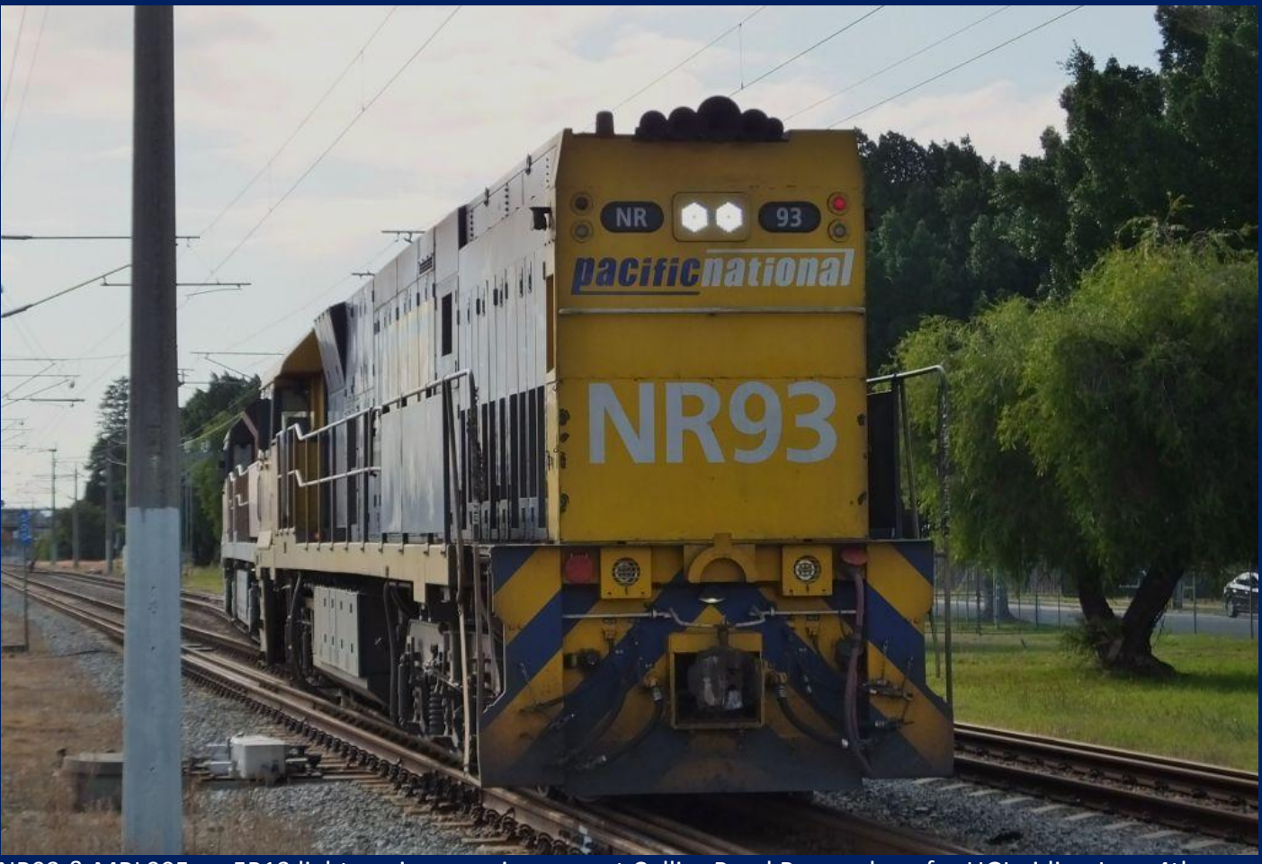
NR93 & MRL005 on 5P13 light engine crossing over at Collier Road Bassendean for UGL siding June 4th.