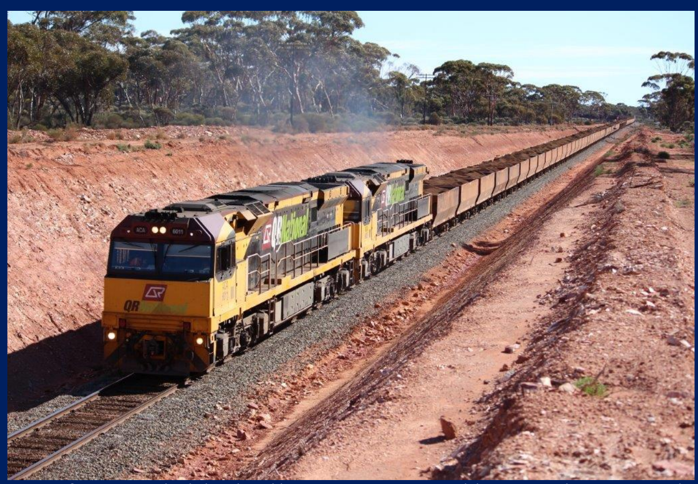
ACA6011 & ACA6005 on loaded Koolyanobbing to Esperance ore at Binduli June 1st.