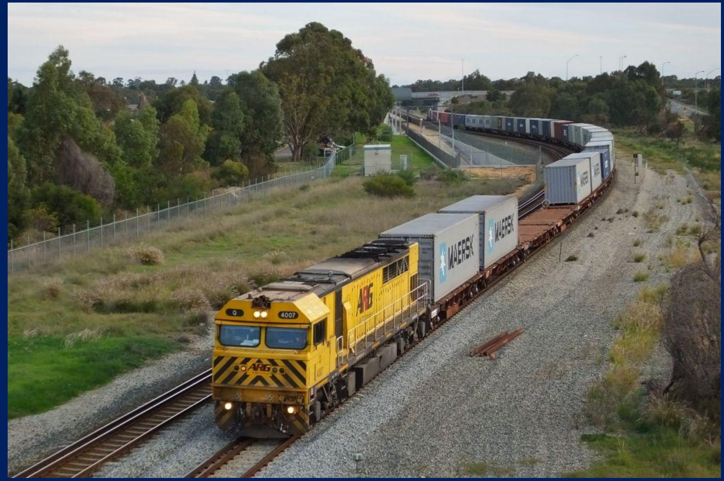
Q4017 on 7141 ILS container ex North Port to Forrestfield at Kenwick June 13th.