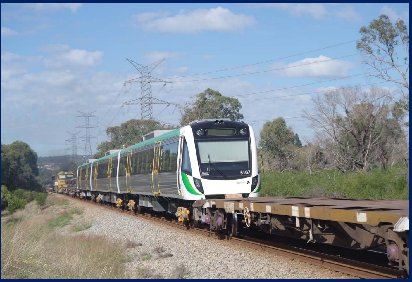
EMU set 107 on 3P32 movement at Middle Swan on way to Midland June 5th.