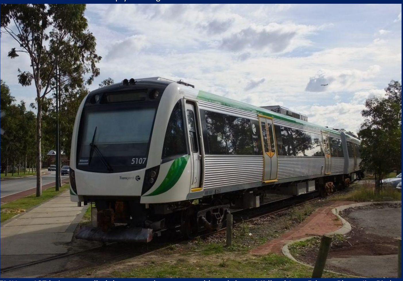
EMU set 107 being propelled thru car park on way to old workshops Midland June 5th.