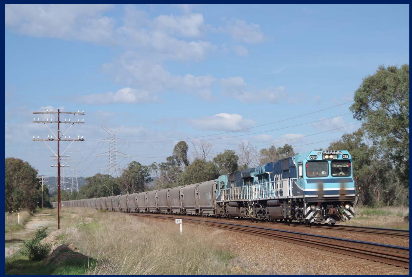
CBH025 & CBH008 on 6K05 empty Watco grain at Middle Swan June 5th.