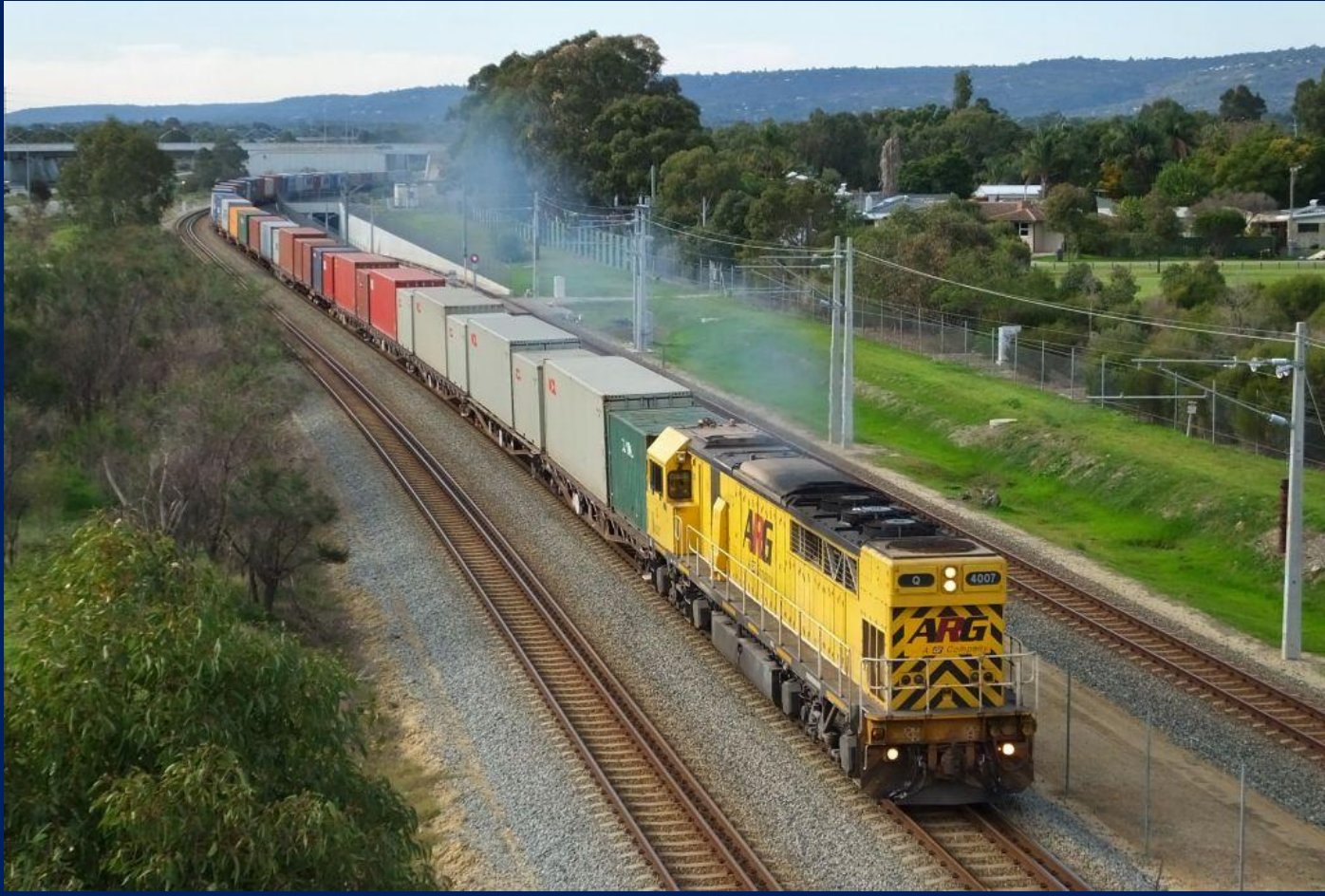
Q4007 on 5144 ILS container train at Kenwick June 11th.