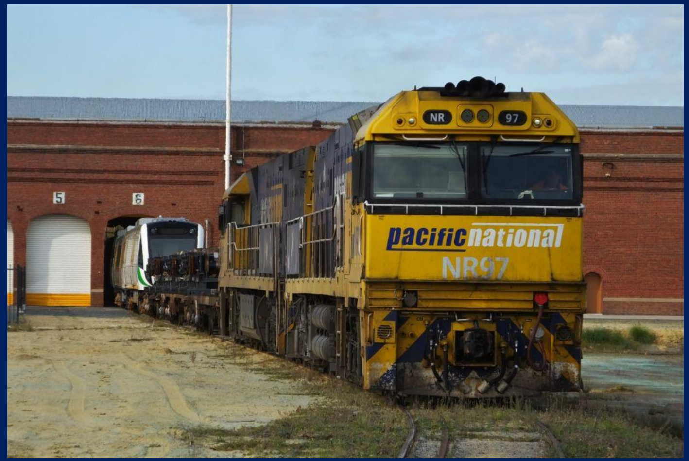
NR97 & NR76 propelling EMU set 107 into old workshops for bogie conversion June 5th.