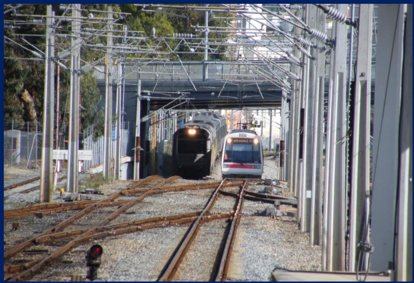
EMU set 45 on Armadale service parallel with Australind test train going under Moore Street Bridge 2/6.