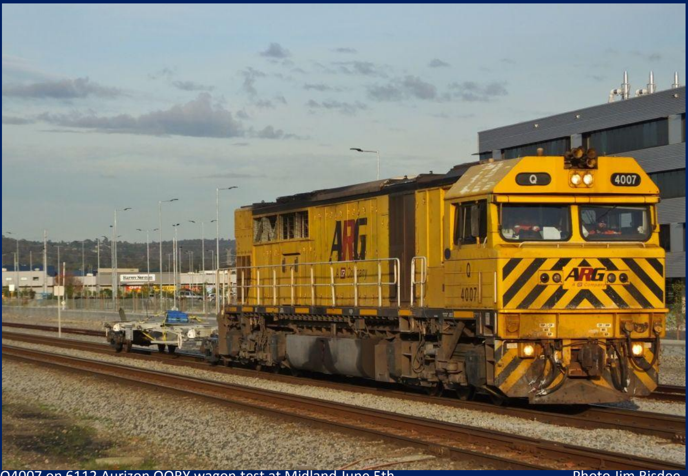
Q4007 on 6112 Aurizon QQBY wagon test at Midland June 5th.