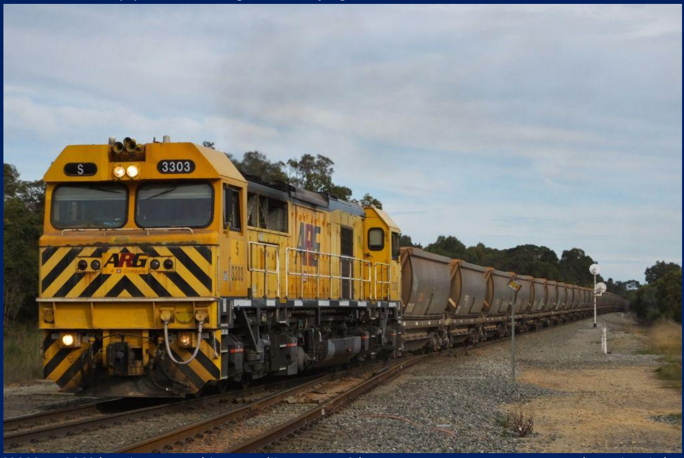
S3303 on 3962 bauxite approaching Mundijong June 16th.