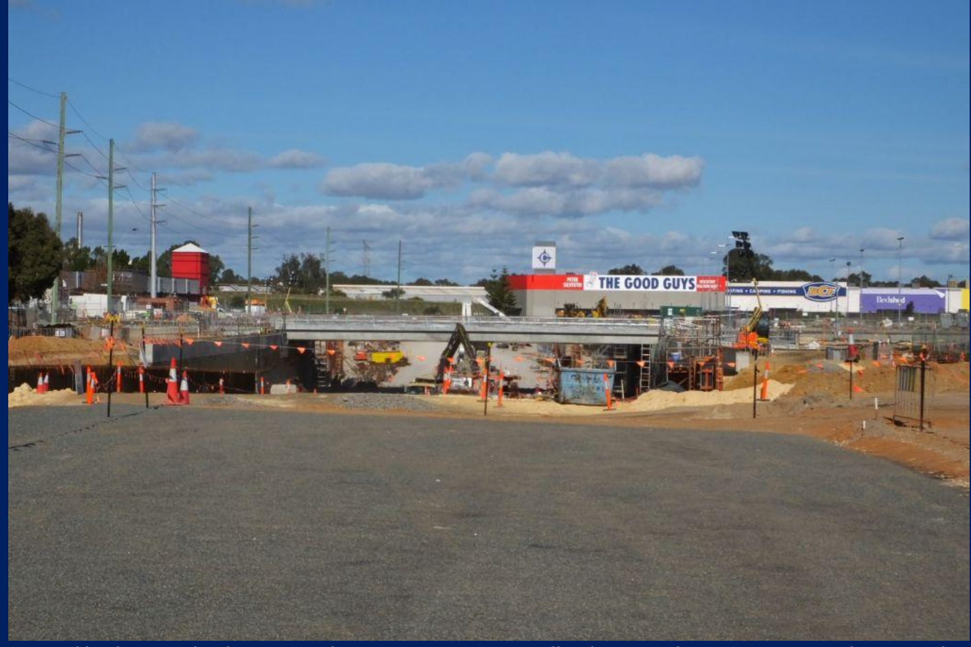
New rail bridges on Lloyd Street grade separation project Midland June 14th.