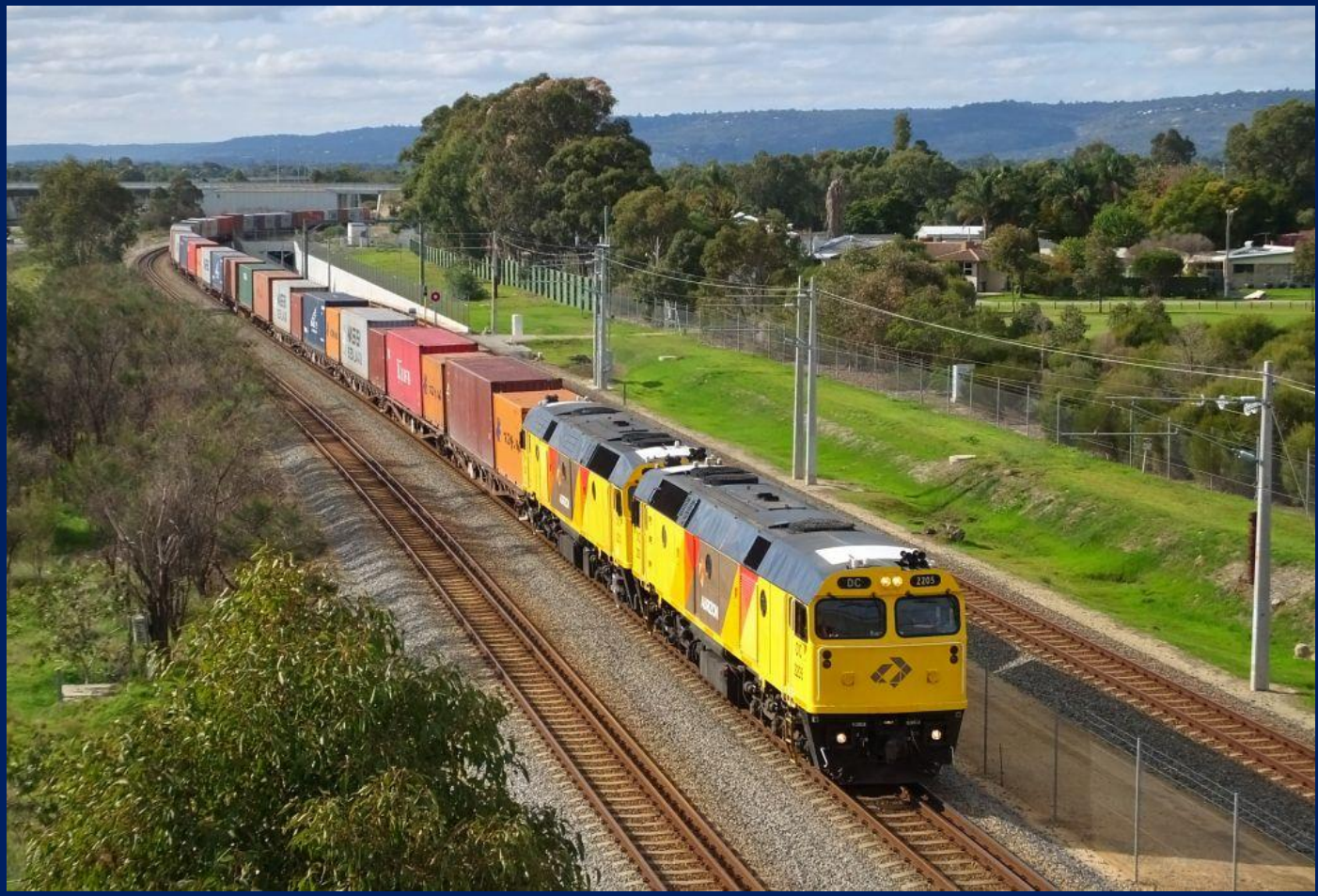
DC2205 & DC2213 on 2144 ILS intermodal service Forrestfield to North Port at Kenwick June 8th.