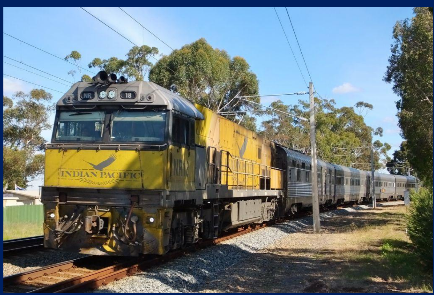
NR18 on 1PA8 Indian Pacific passenger Perth to Adelaide then onto Sydney at East Guildford June 14th.