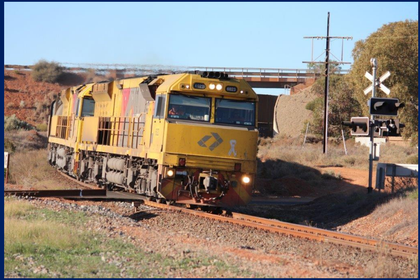
6023 & 6024 on 6MP1 Aurizon intermodal passing under Goldfields Highway 31/5.