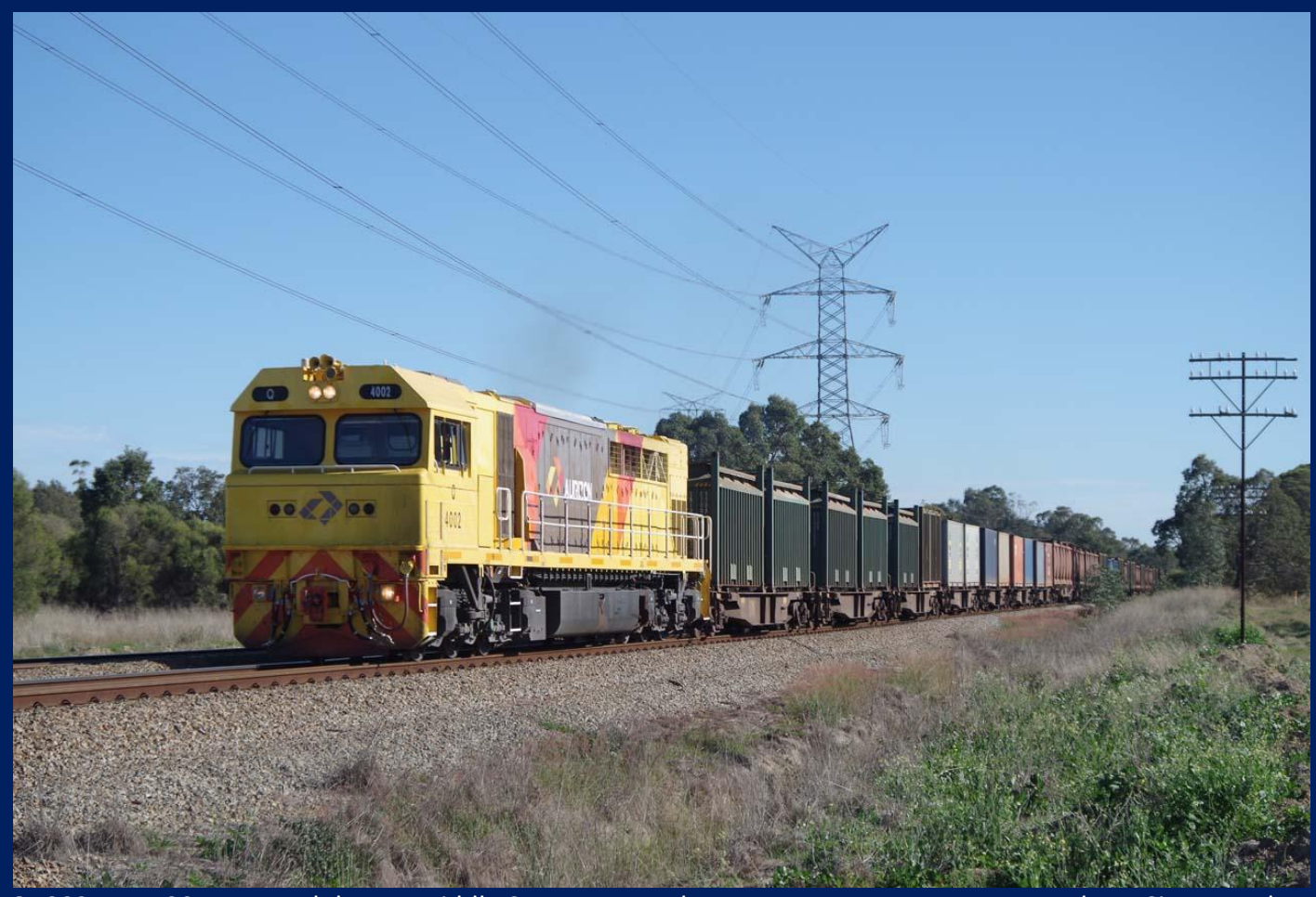
Q4002 on 4430 empty sulphur at Middle Swan June 11th.