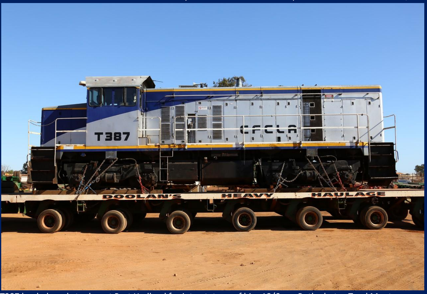
T387 loaded ready to depart Port Hedland for interstate as of hire 18/6.