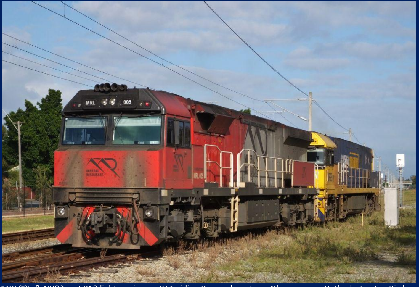
MRL005 & NR93 on 5P13 light engine on PTA siding Bassendean June 4th.