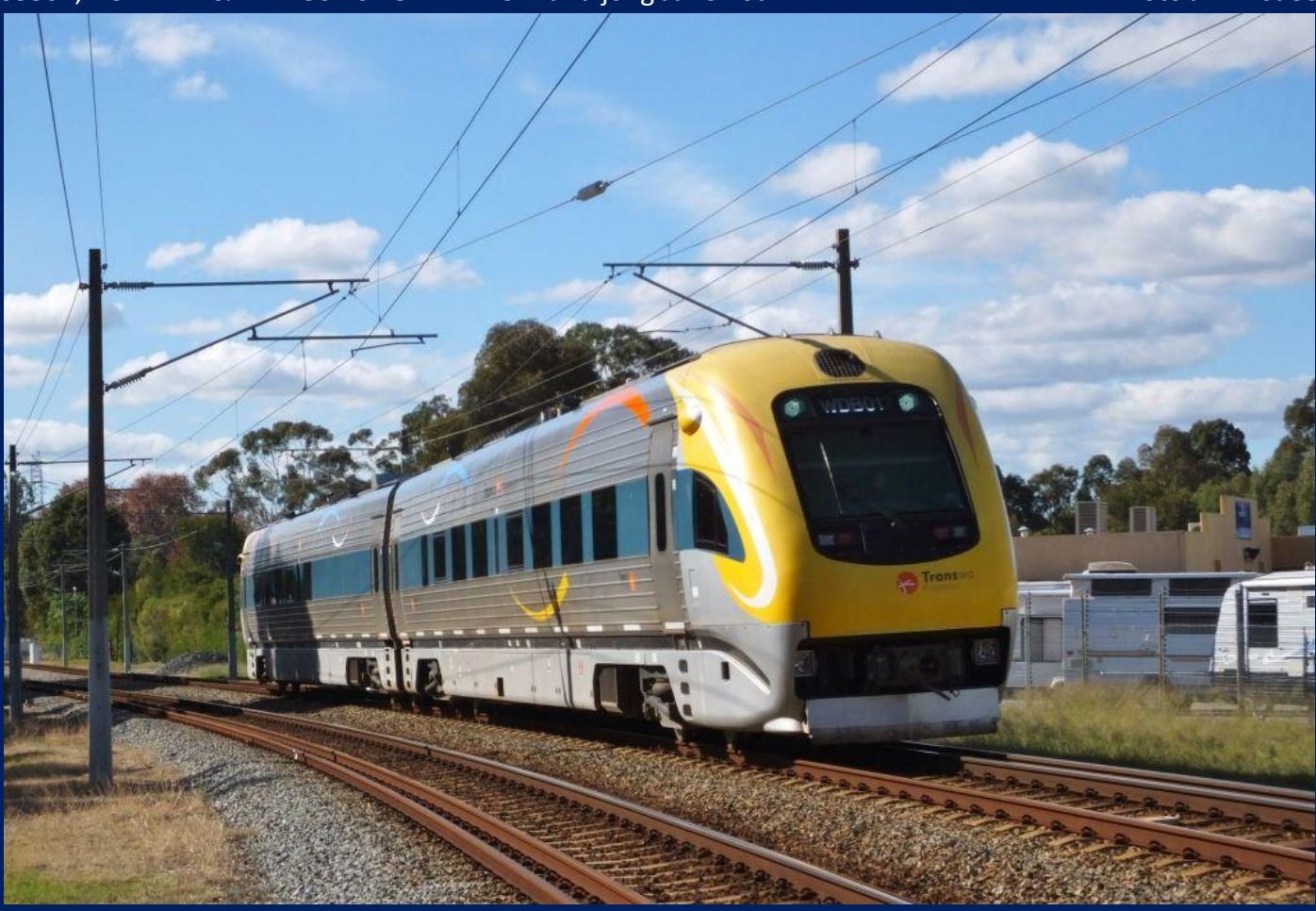
1086 empty Prospector cars to East Perth at East Guildford June 14th.