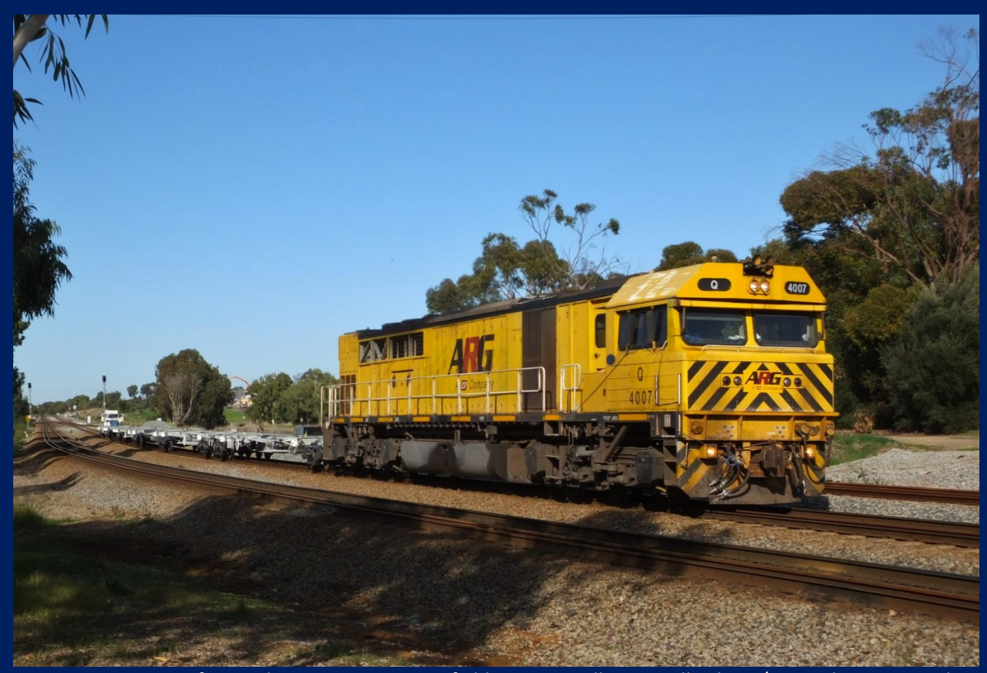
Q4007 on 3111 new five pack wagon test Forrestfield to Hines Hill at Woodbridge 9/6.