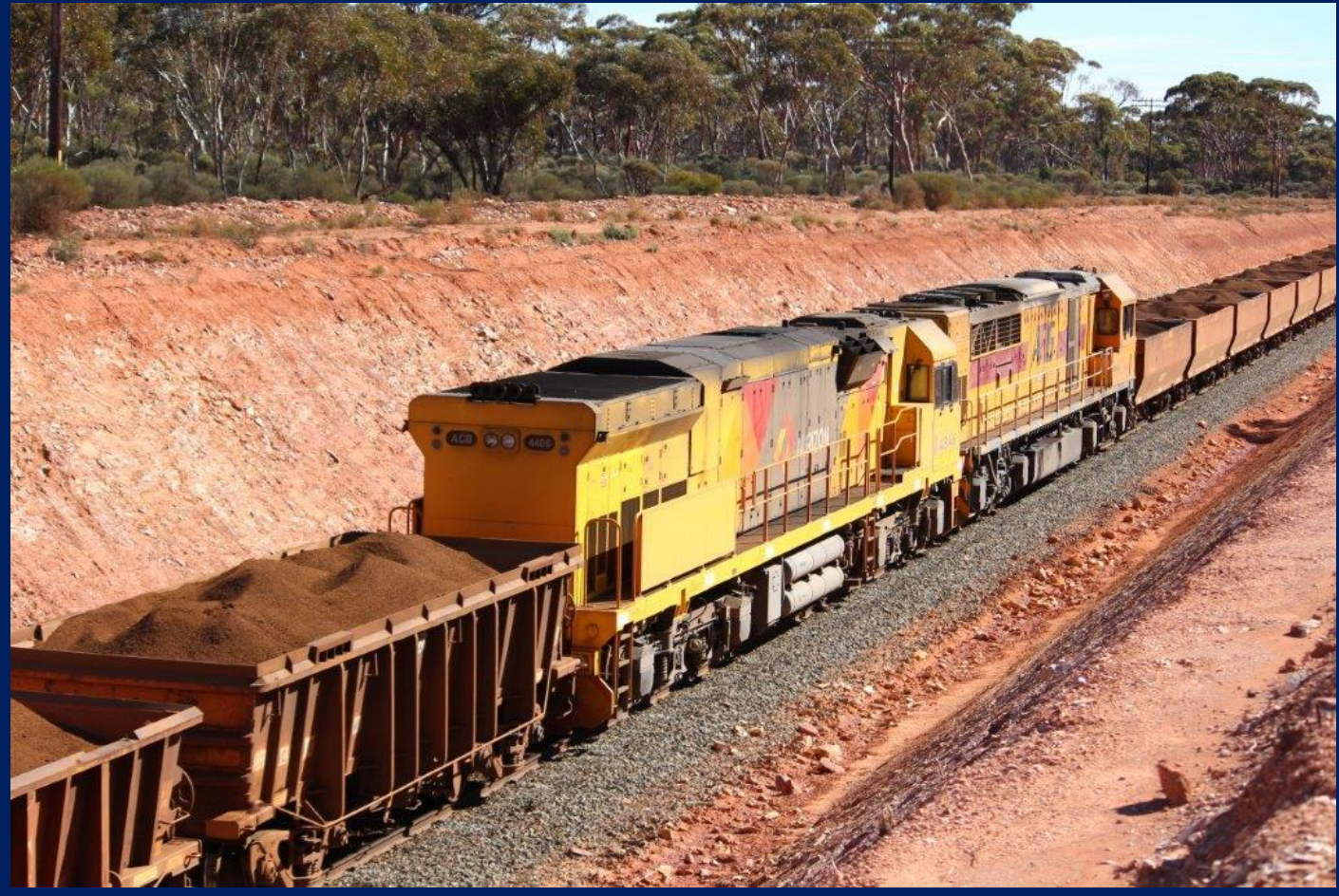
ACB4406 & Q4014 DPU on the loaded ore to Esperance at Binduli June 1st.