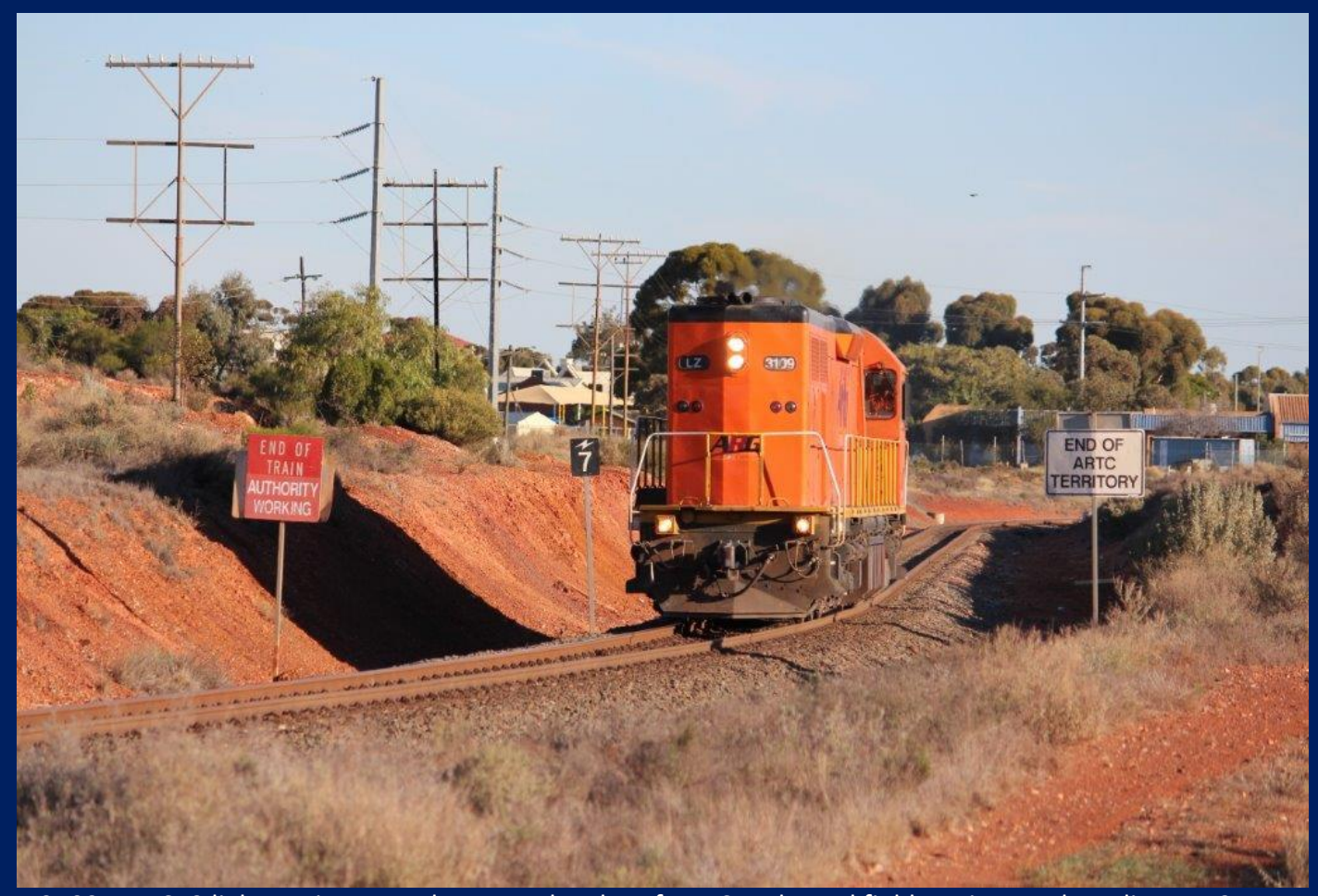
LZ3109 on 1C73 light engine to Parkeston at border of ARTC and Brookfield territory Kalgoorlie May 31st.