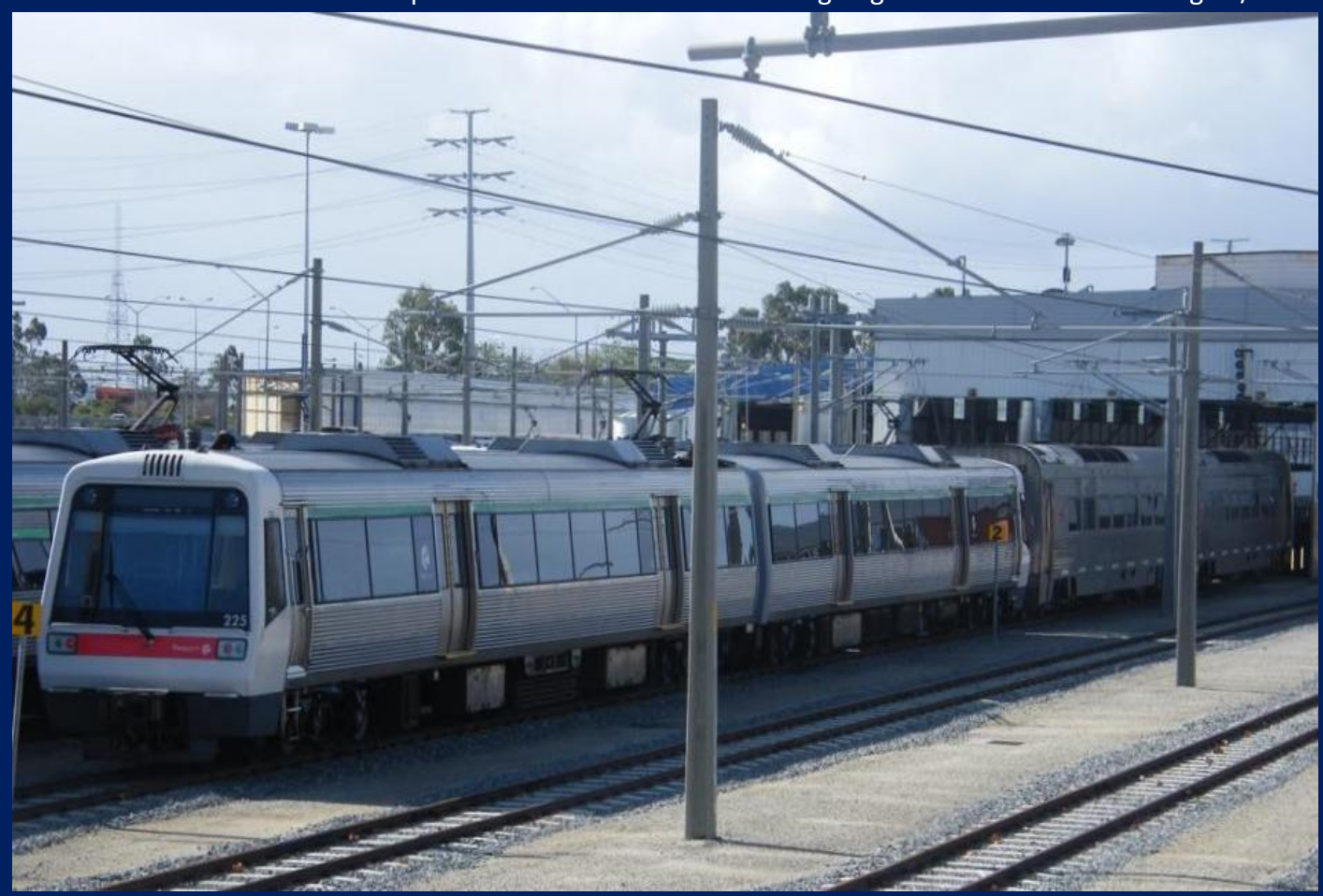
EMU set 25 that hauled Australind test back in Claisebrook yard June 2nd.