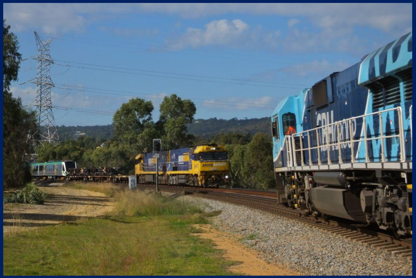
CBH025 crosses NR97 & NR76 on 3P32 with EMU set 107 at Bellevue June 5th.

Publisher: Jim Bisdee Email: pm1225@bigpond.com Copyright Jim Bisdee © 2015