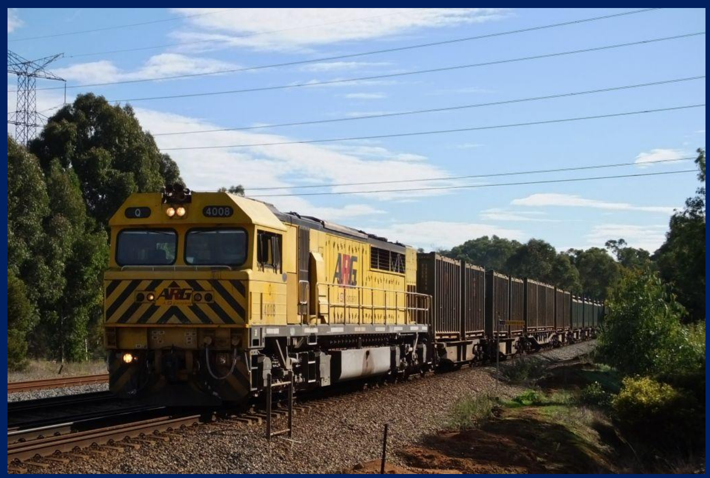
Q4008 on 5430 empty sulphur ex Leonora to Kwinana at Woodbridge June 5th.