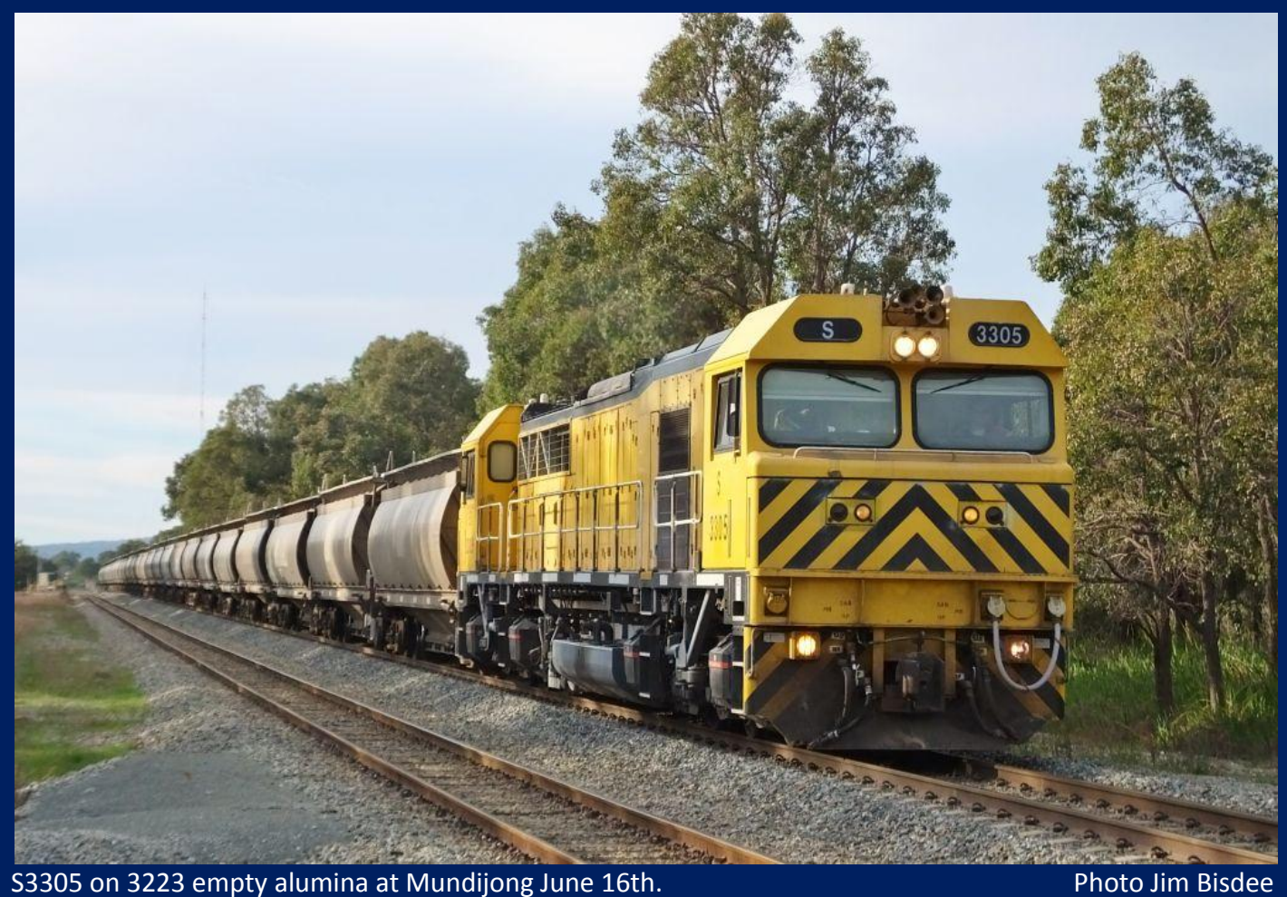
S3305 on 3223 empty alumina at Mundijong June 16th.