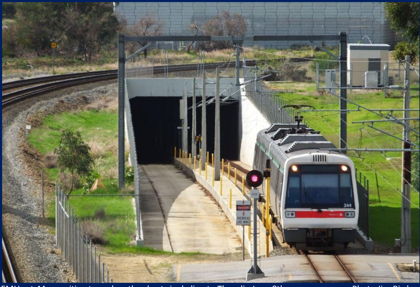
EMU set 44 on exiting tunnel on the short single line to Thornlie June 8th.