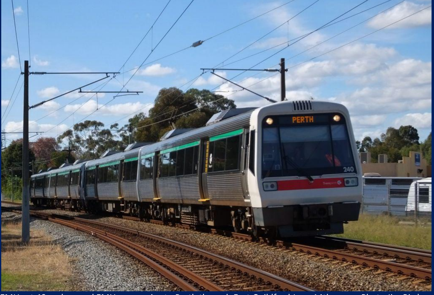
EMU set 40 and second EMU run service to Perth through East Guildford June 14th.

LZ3106 on 6RT9 rescue service to recover wagon at Cunderdin Swan View May 29th.