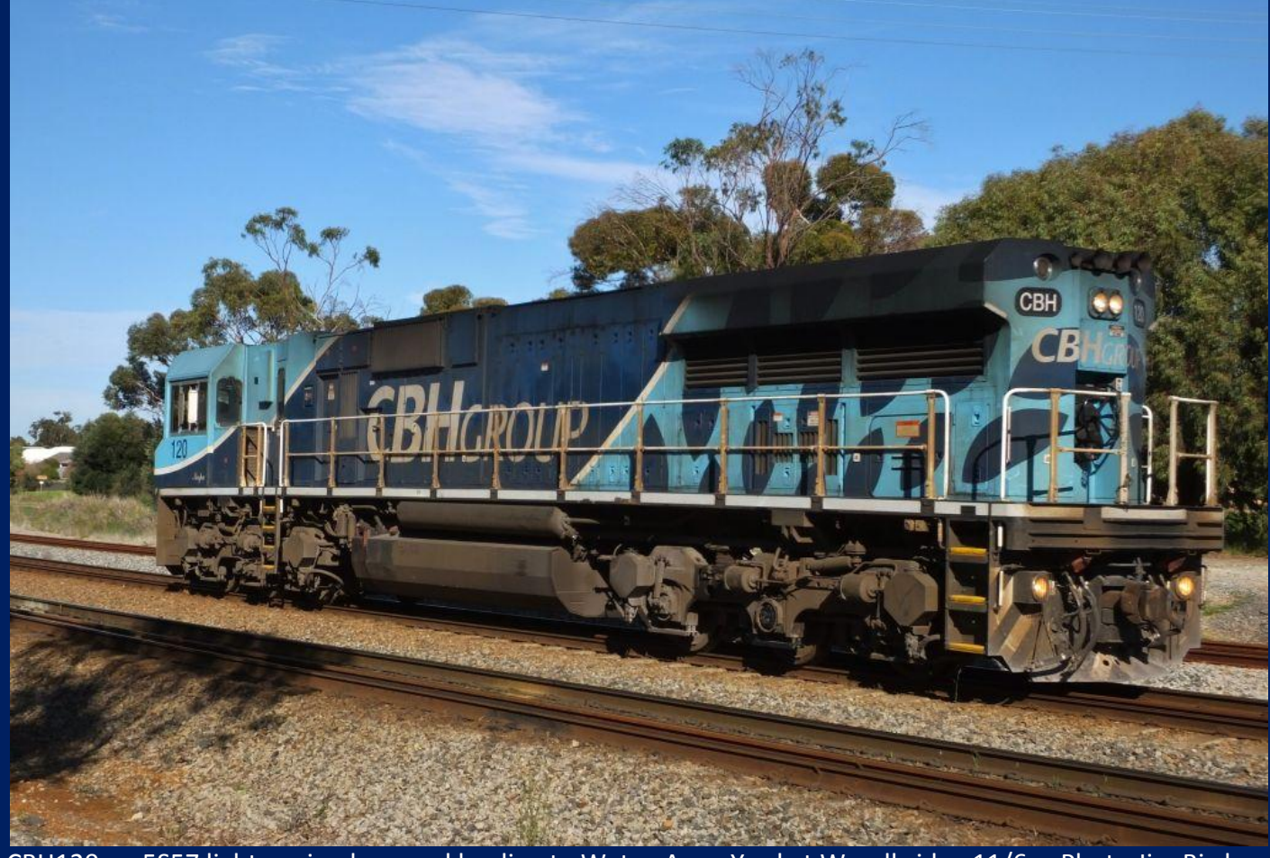
CBH120 on 5S57 light engine long end leading to Watco Avon Yard at Woodbridge 11/6.