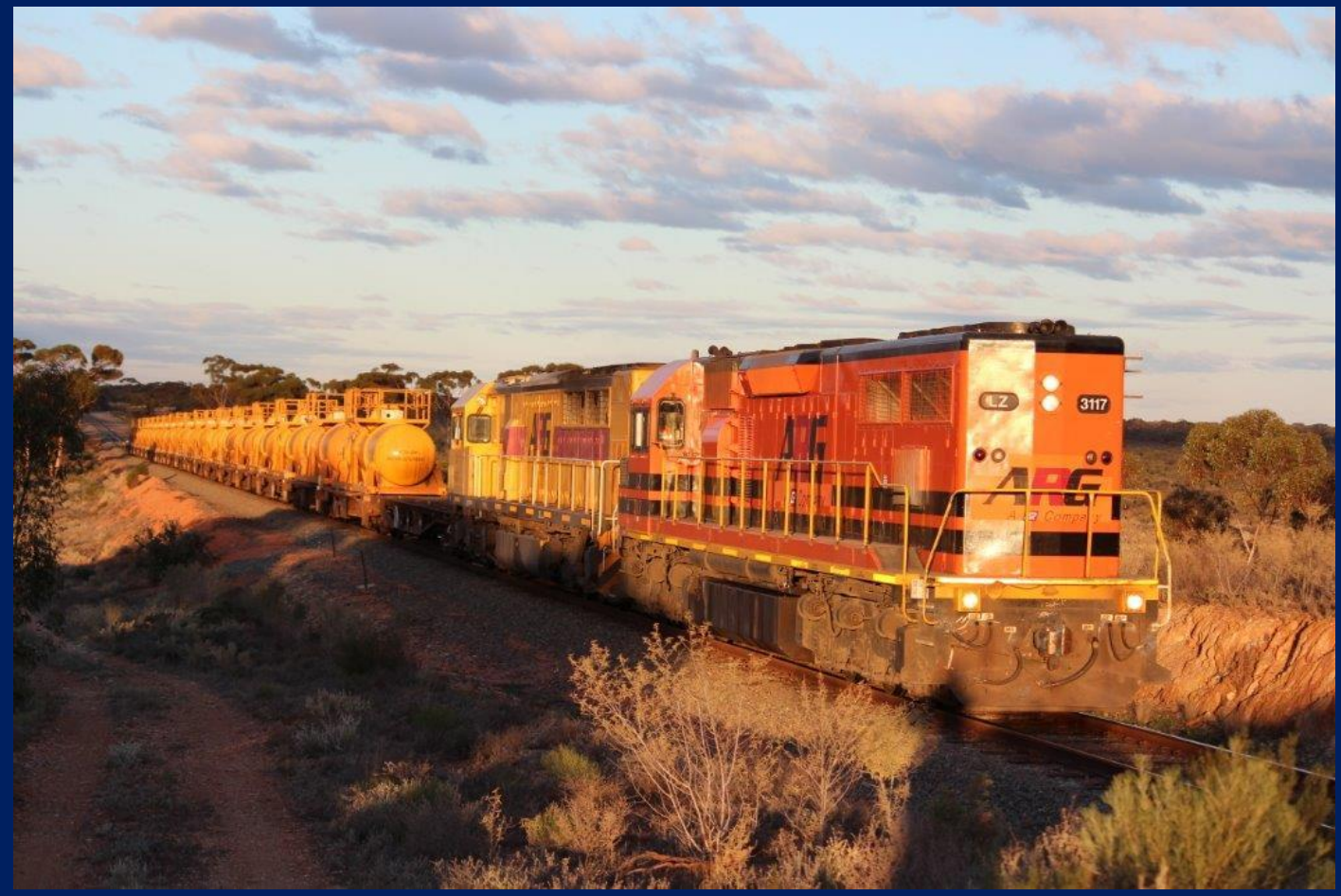
LZ3117 & Q4006 on 3410 acid tankers Hampton to West Kalgoorlie at Binduli 2/6.