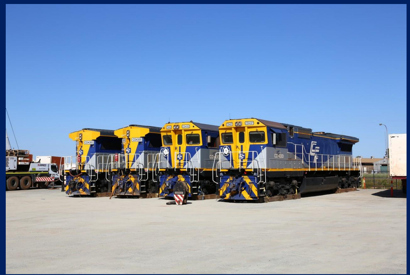
Of hire CFCLA CM40-8 CD4301, CD4302, CD4303 &CD4305 stored at Wedgefield.