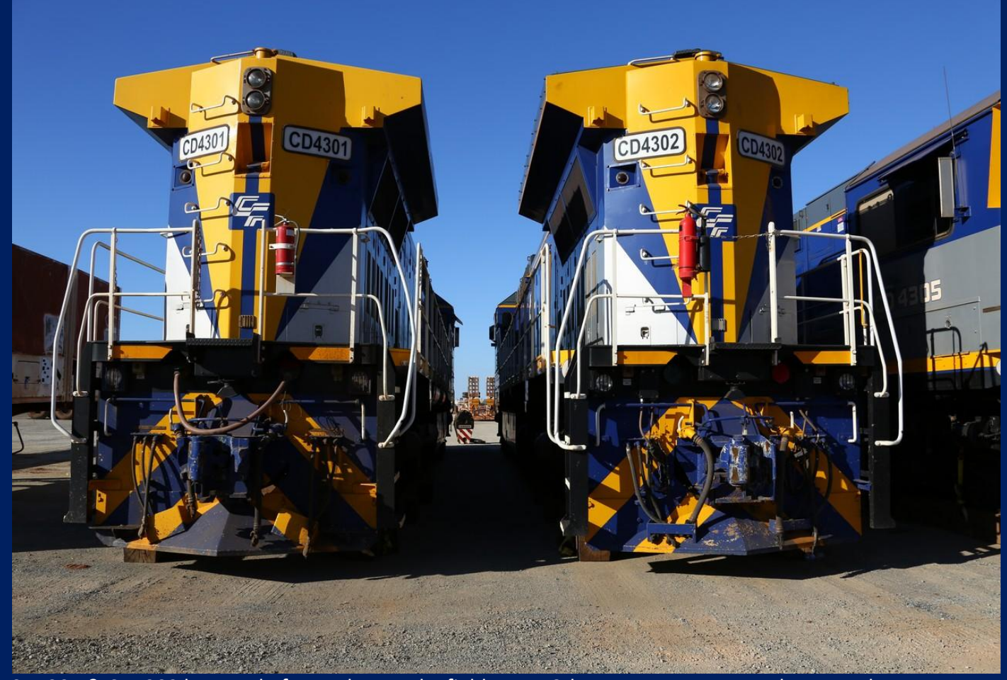
CD4301 & CD4302 long end of stored at Wedgefield June 18th.