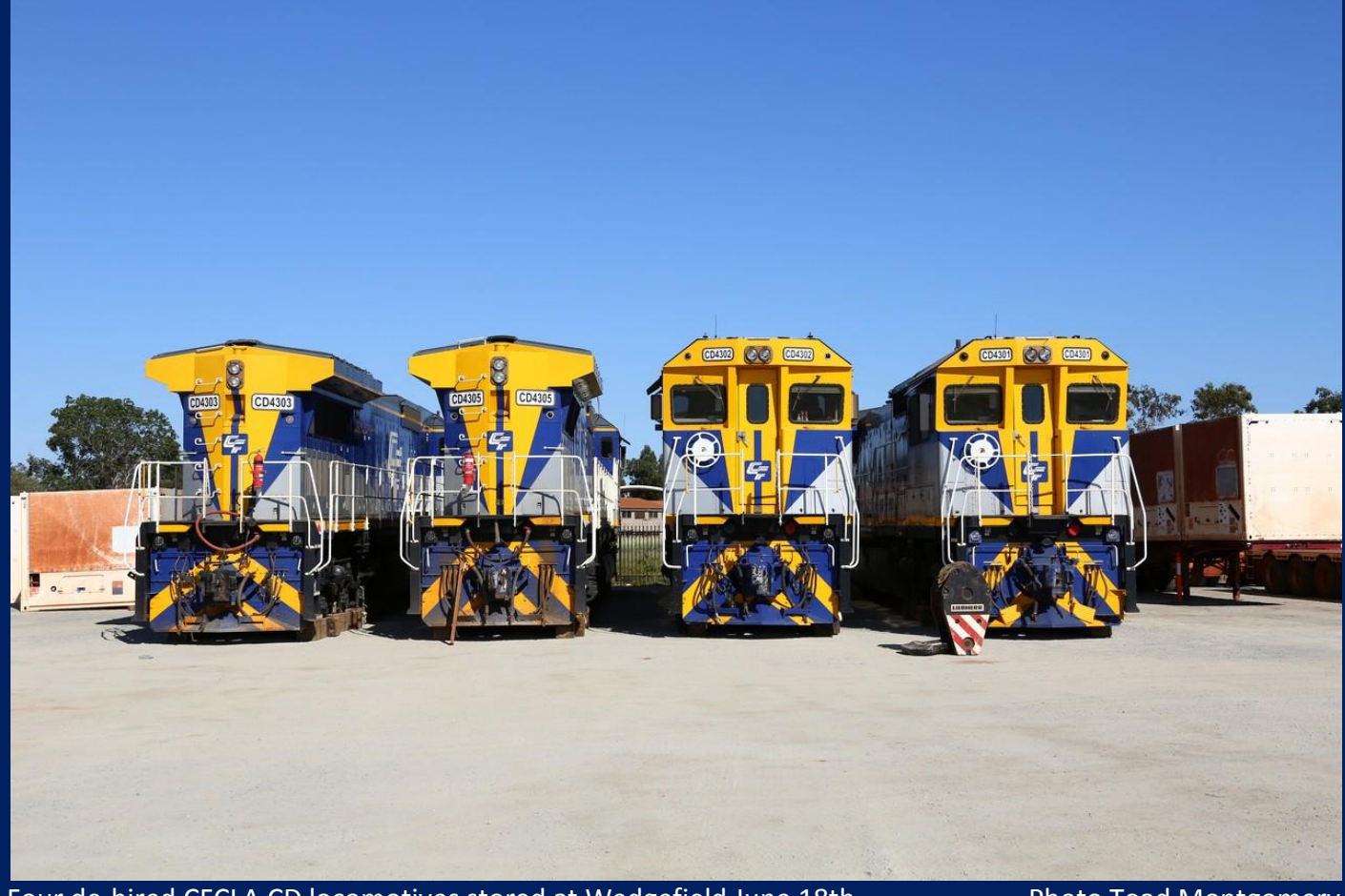
Four de-hired CFCLA CD locomotives stored at Wedgefield June 18th.