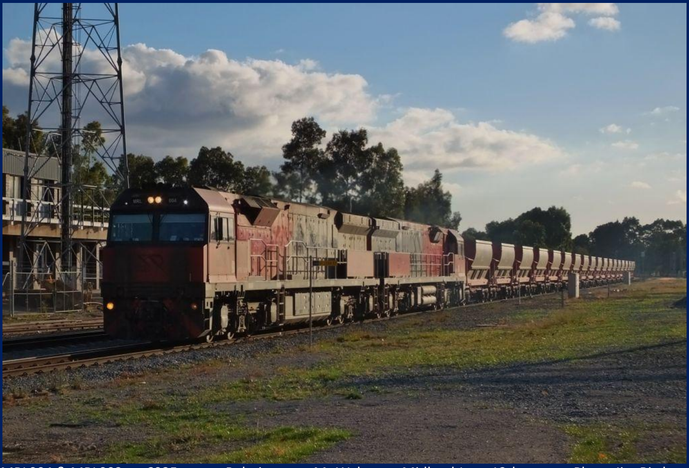
MRL004 & MRL002 on 6035 empty Polaris ore to Mt Walton at Midland June 12th.