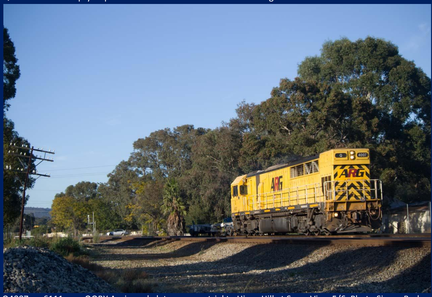
Q4007 on 6111 new QQBY Aurizon skeleton wagon trial to Hines Hill at Swan View 5/6.