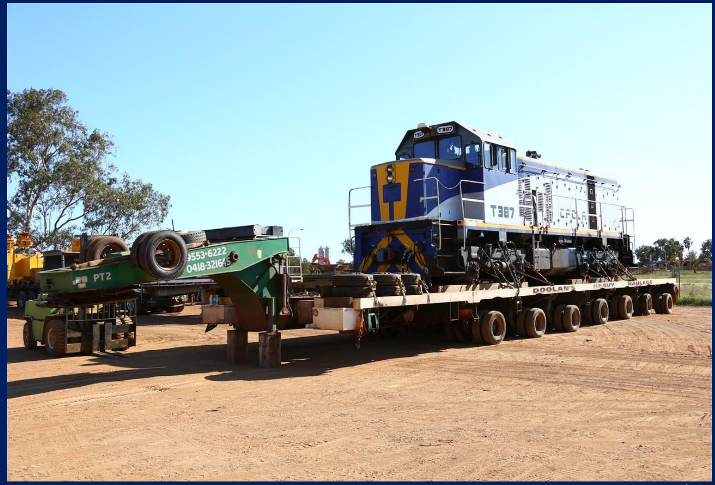
Of hire CFCLA T387 used on ballast trains at Roy Hill Port Hedland on transport float at Doolans Yard 18/6.