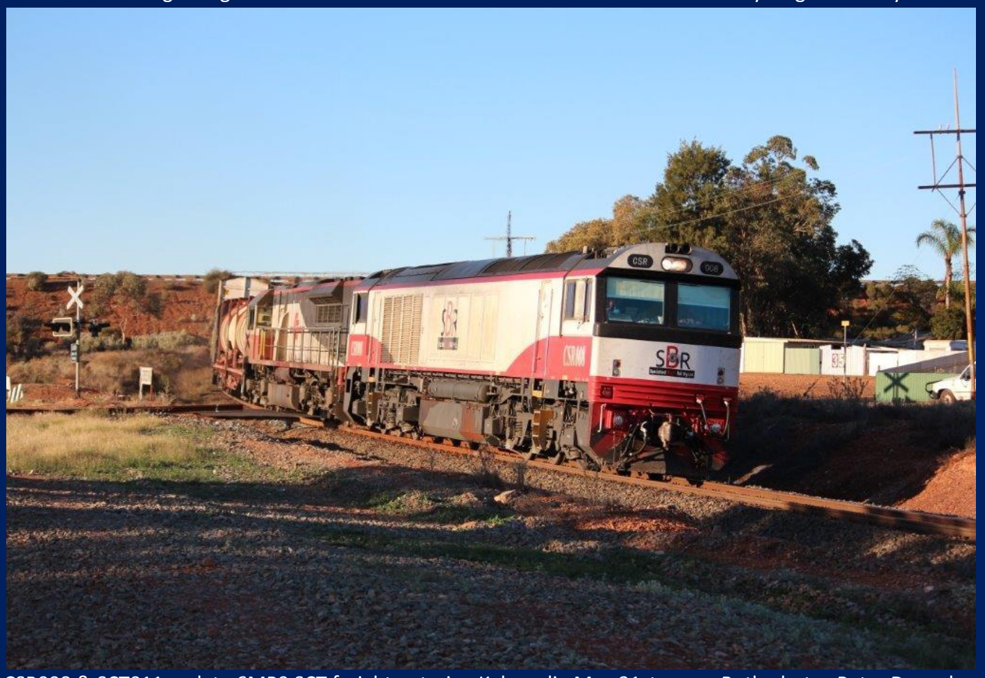
CSR008 & SCT011 on late 6MP9 SCT freight entering Kalgoorlie May 31st.