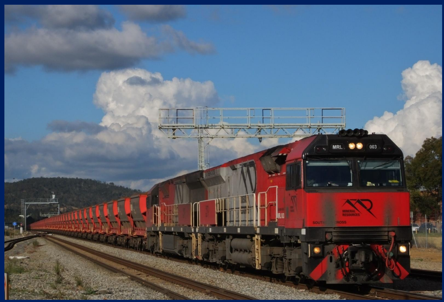
MRL003 & MRL006 on 6030 Polaris ore at Midland June 12th.