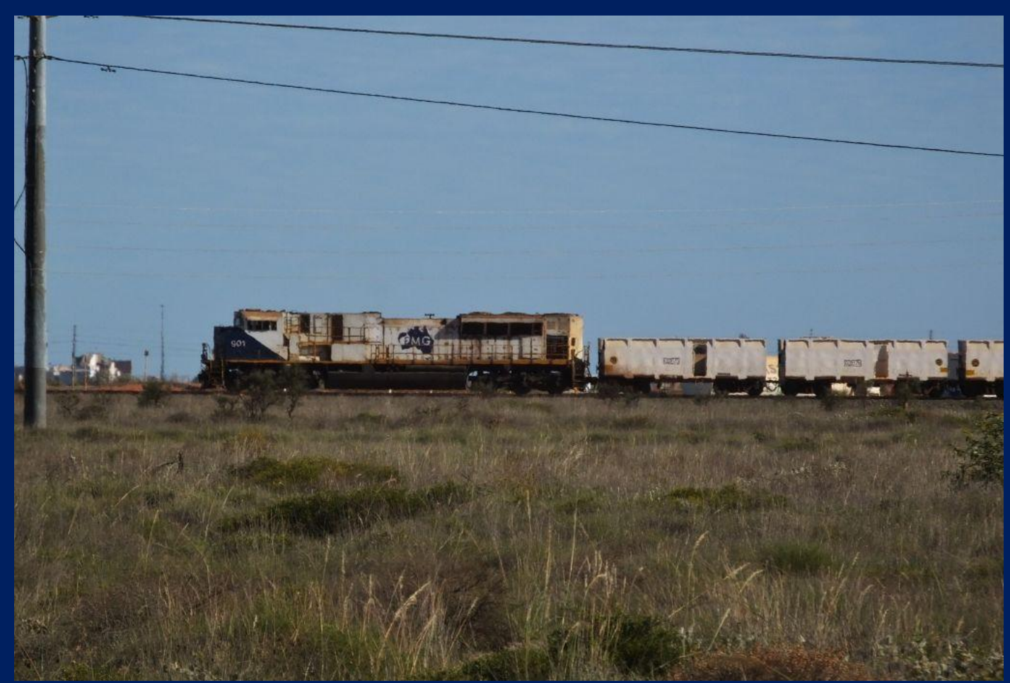
FMG SD9043MAC 901 stabled on idler cars at entrance to port yard Boodarie July 10th.