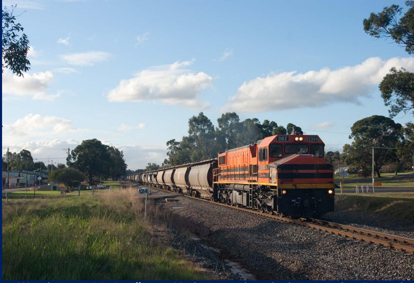
DBZ2304 only DBZ remaining in traffic runs 1867 alumina at Yarloop July 5th.