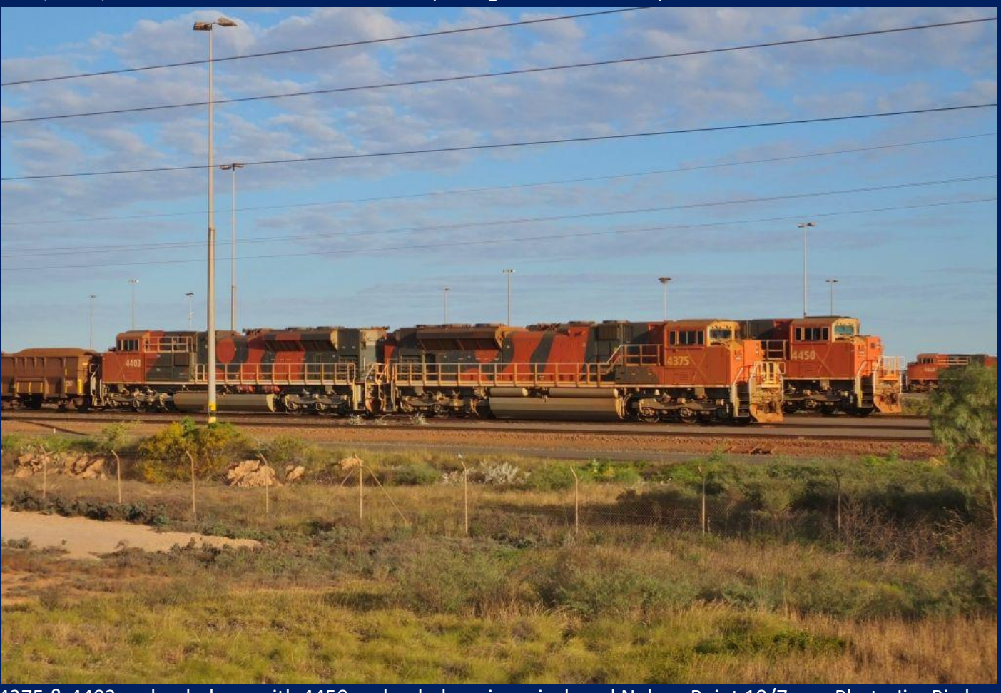
4375 & 4403 on loaded ore with 4450 on loaded ore in arrival yard Nelson Point 10/7.