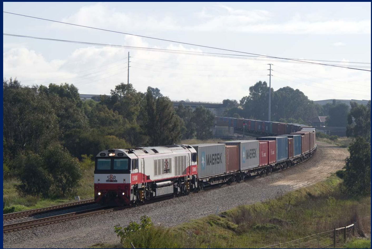
SCT008 on 7144 first SCT run ILS container train to North Port at Wattle Grove 4/7.