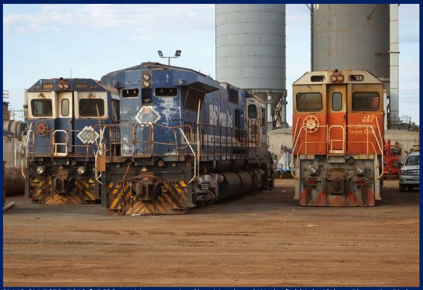
CM40-8M 5659, 5640 & 5638 awaiting scrapping Sims Metal yard Wedgefield July 12th.