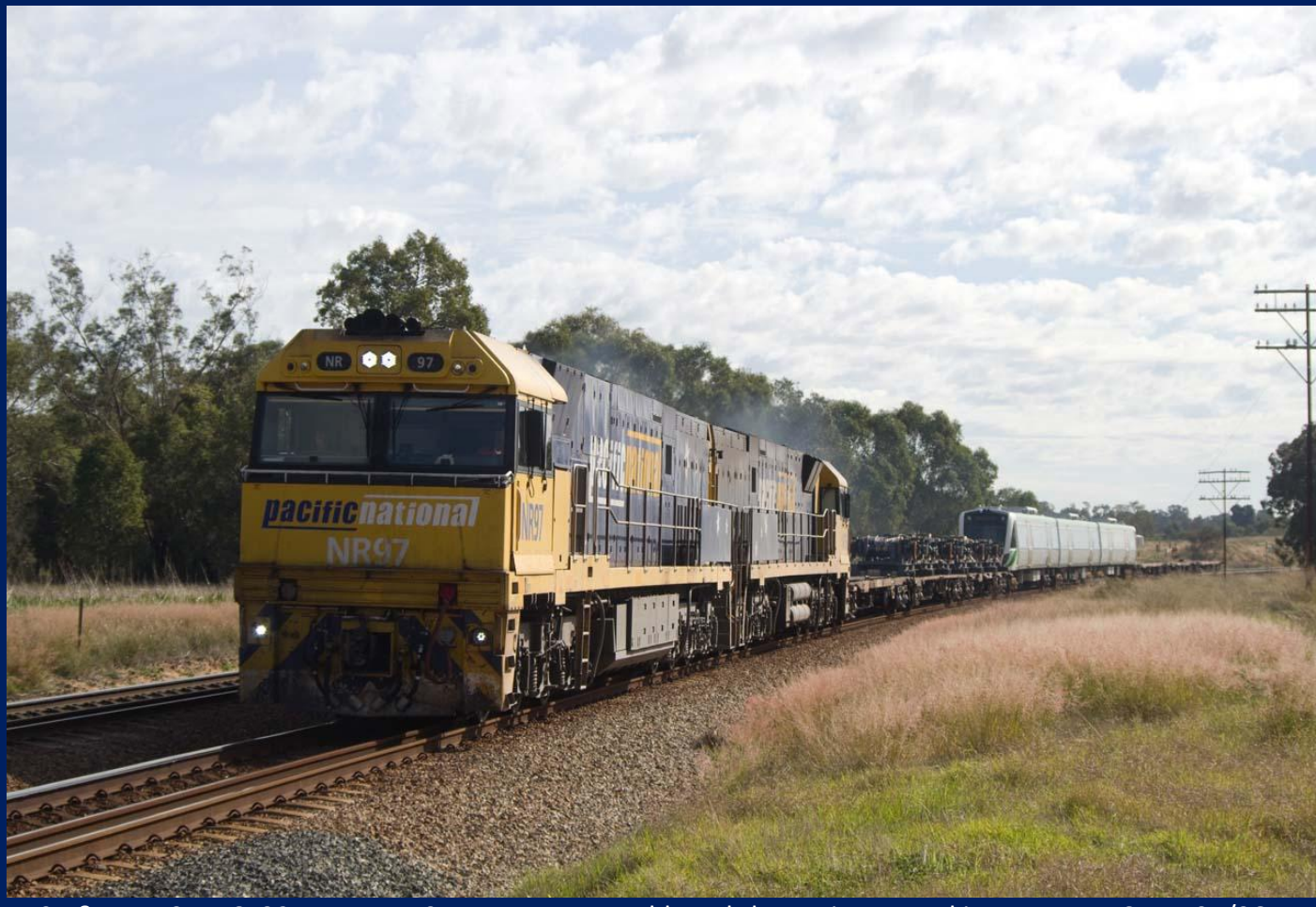
NR97 & NR113 on 6P32 EMU set 107 movement to old workshops via Jumperkine at Upper Swan 05/06.