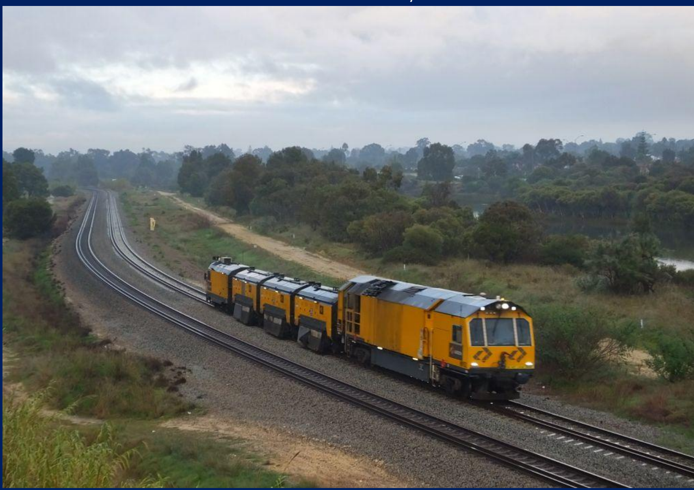
MMY32 Aurizon rail grinder in the rain running thru Wattle Grove July 4th.