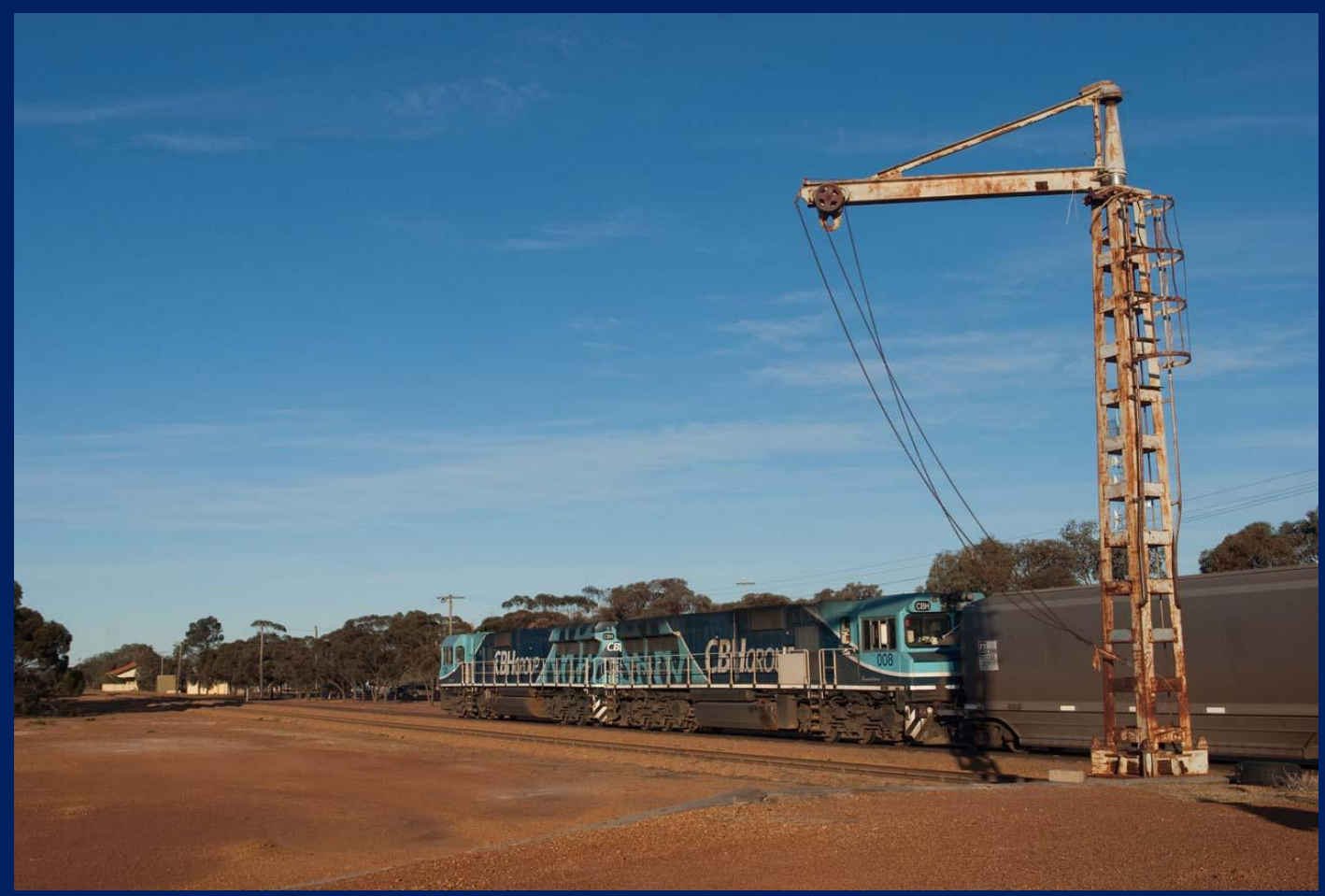
CBH025 & CBH008 on 6K65 empty Watco grain at Mukinbudin July 17th.