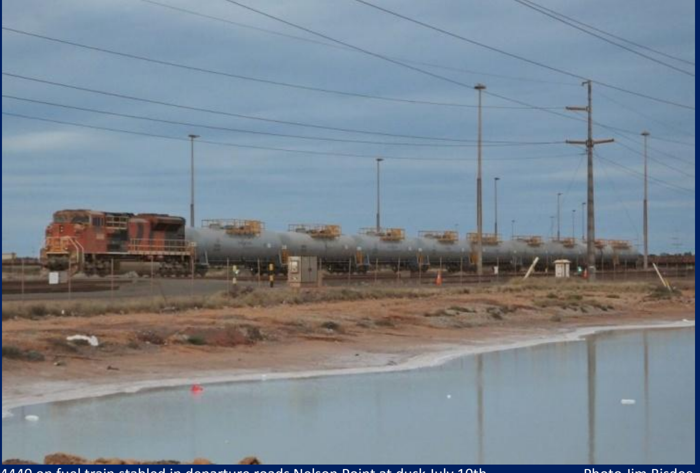
4440 on fuel train stabled in departure roads Nelson Point at dusk July 10th.