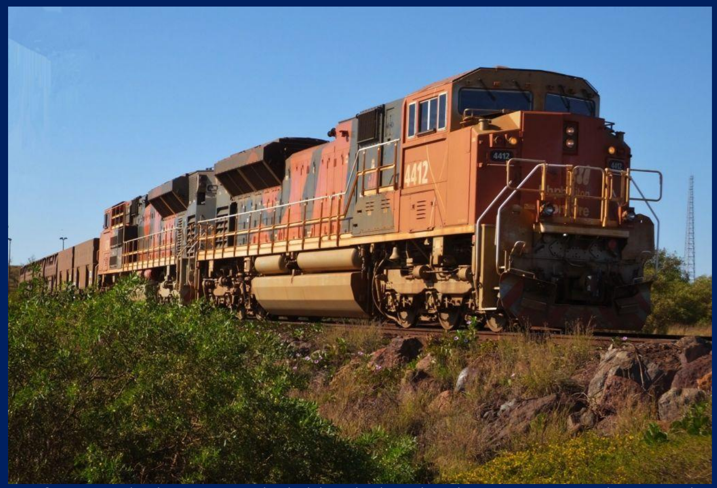
4412 & 4374 rounding loop Finucane Island whilst unloading July 10th.