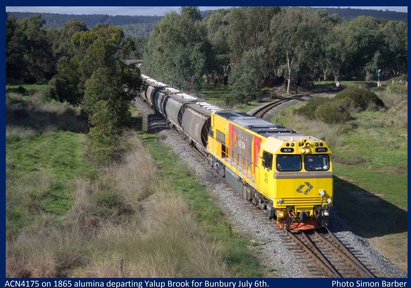
ACN4175 on 1865 alumina departing Yalup Brook for Bunbury July 6th.