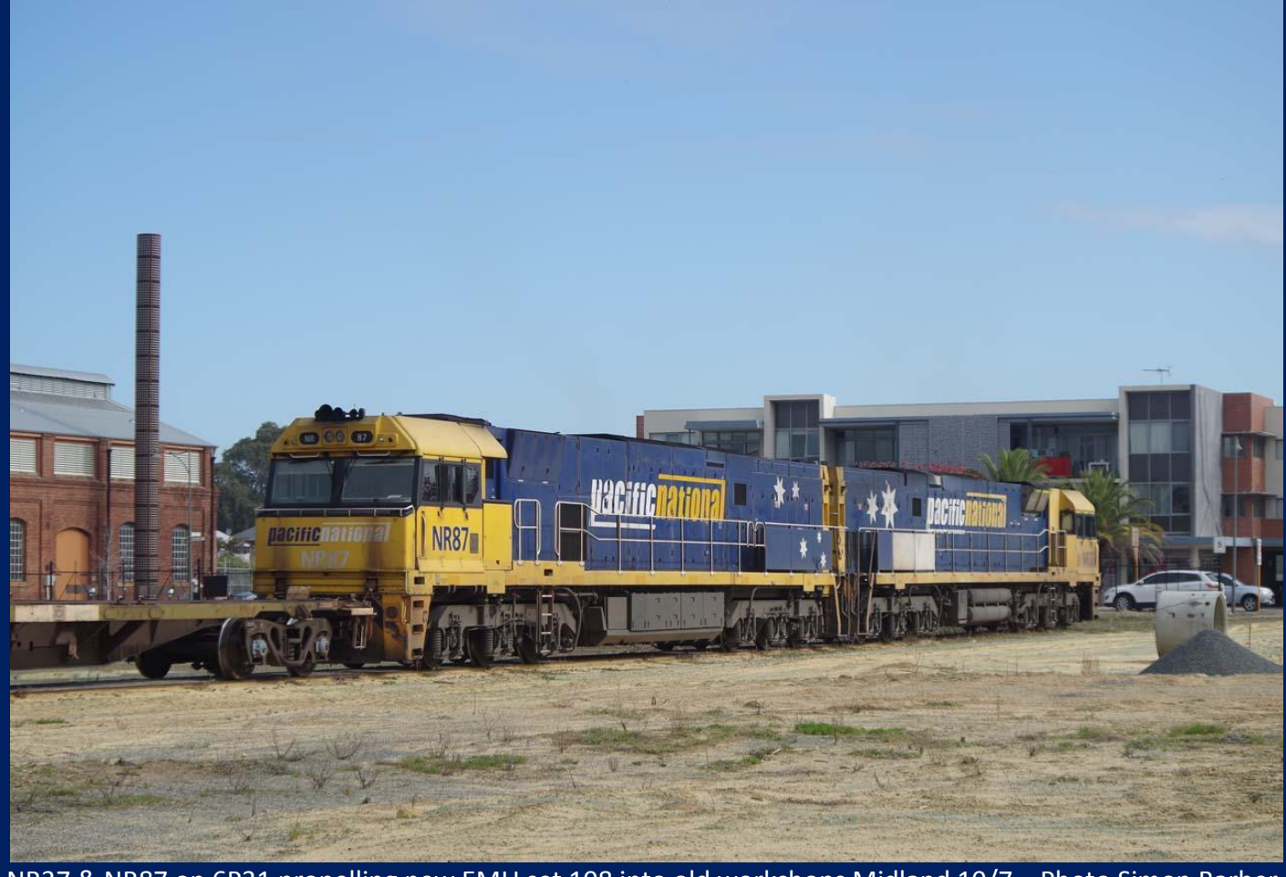
NR37 & NR87 on 6P31 propelling new EMU set 108 into old workshops Midland 10/7.