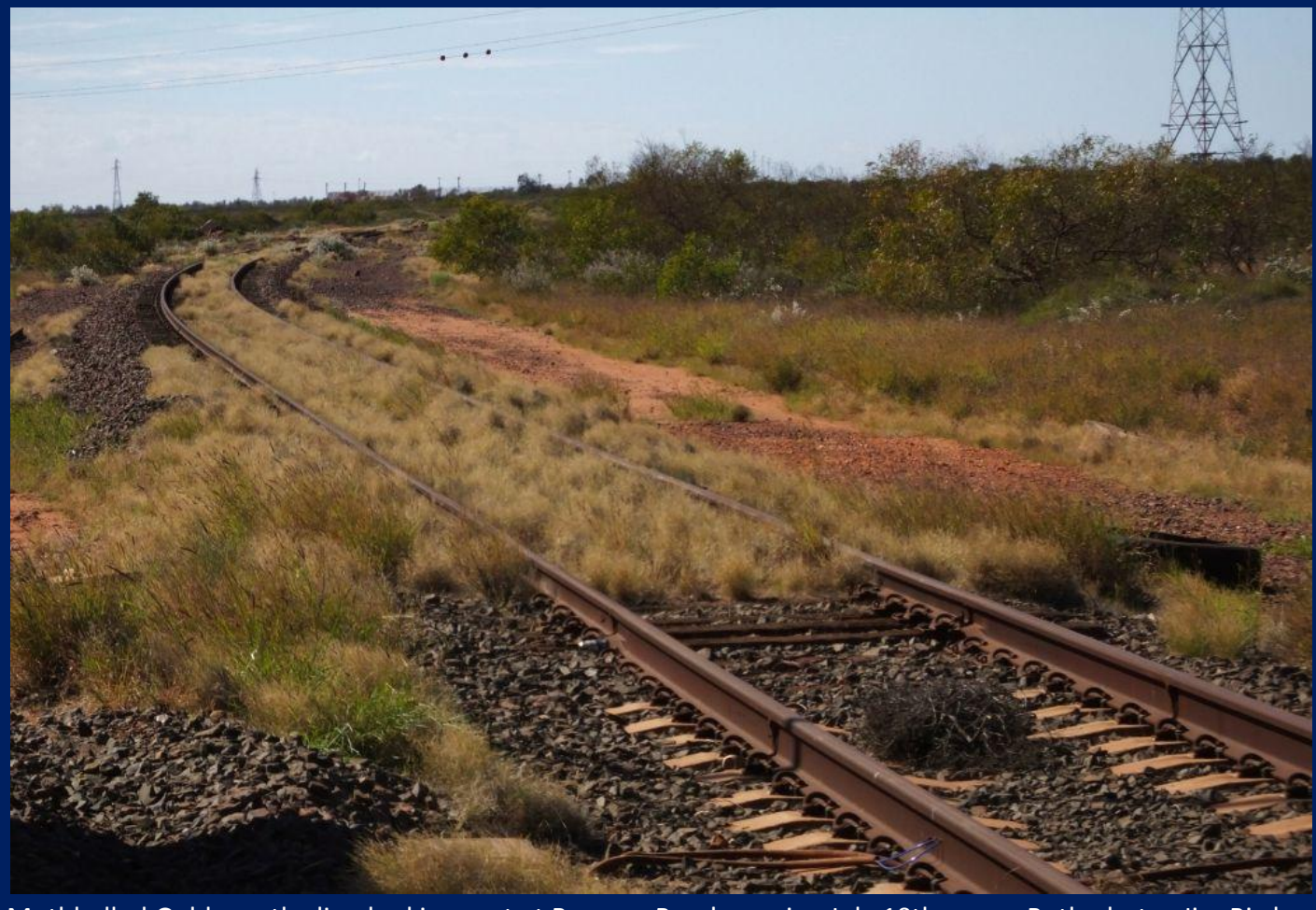
Mothballed Goldsworthy line looking east at Broome Road crossing July 10th.