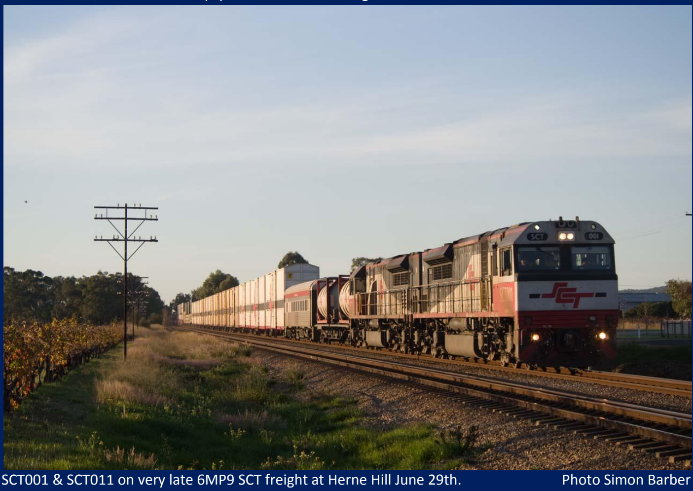
SCT001 & SCT011 on very late 6MP9 SCT freight at Herne Hill June 29th.