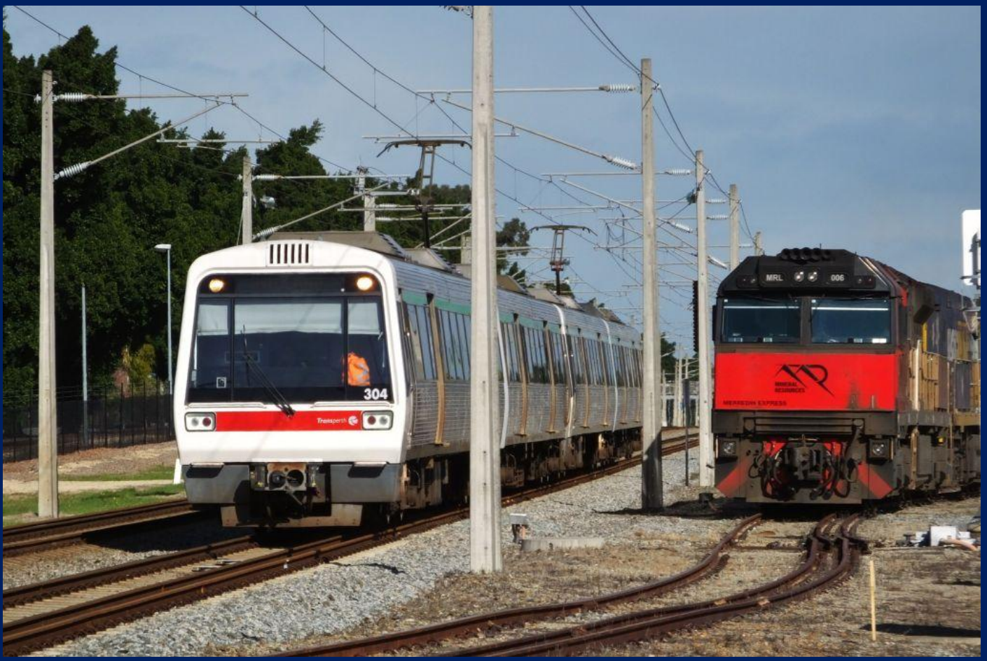
EMU set 304 passes MRL006 & NR59 that had just entered Bassendean siding July 21st. Photo Jim Bisdee

Publisher: Jim Bisdee Email: <a href="mailto:pm1225@bigpond.com">pm1225@bigpond.com</a> Copyright: Jim Bisdee © 2015