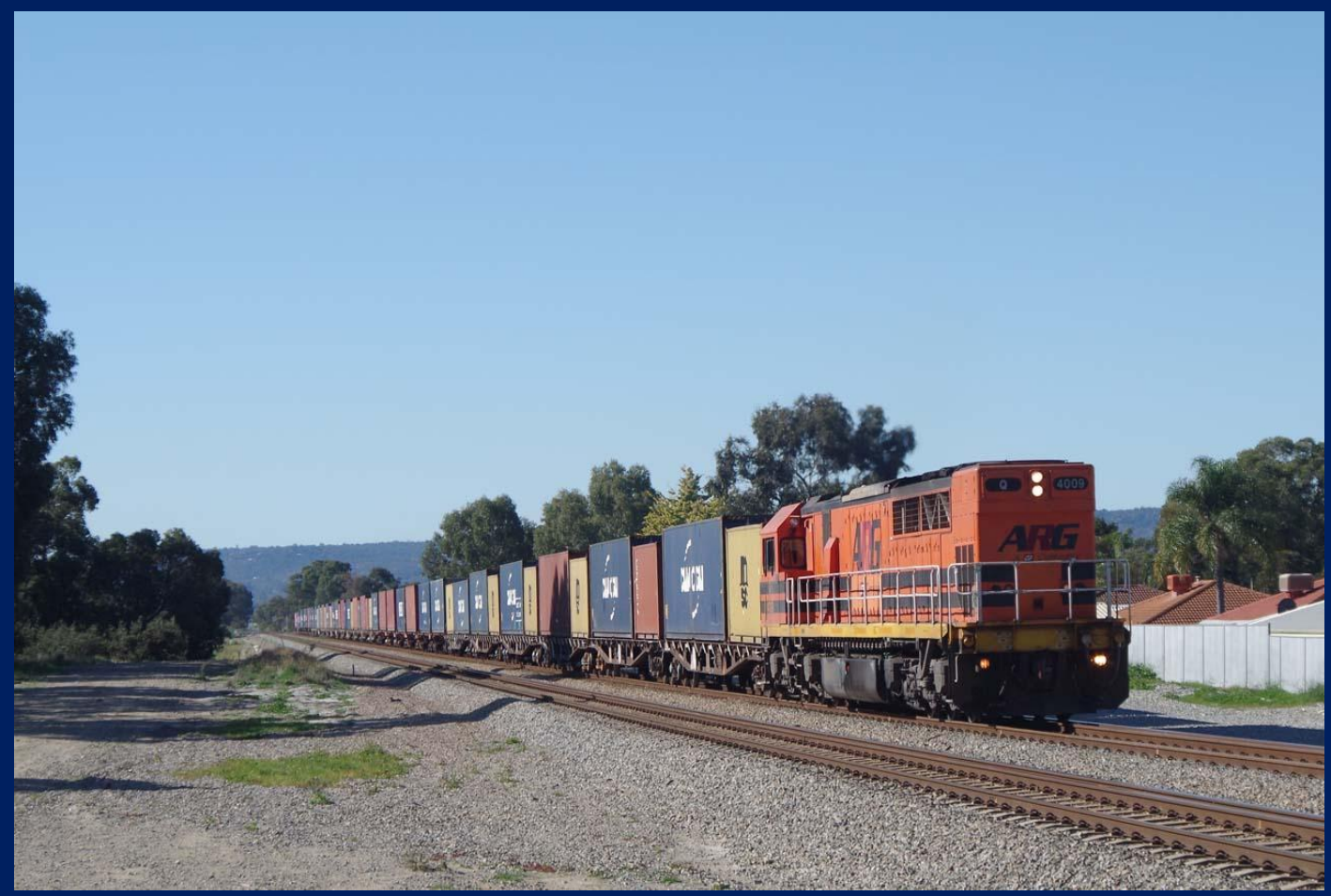
Q4009 on 1144 ILS container train passing thru Canning Vale June 28th.