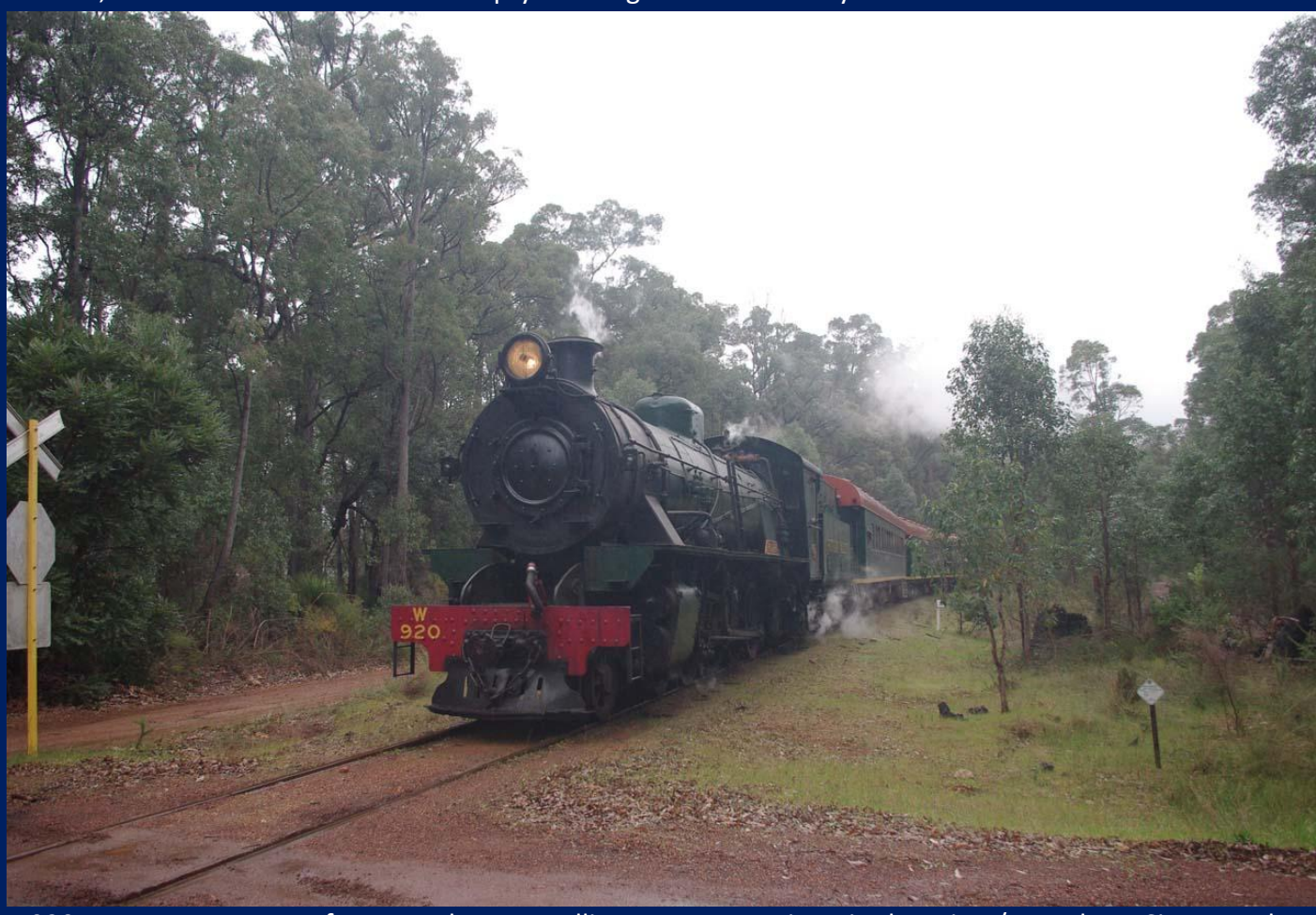
W920 on 1HV1 passenger from Isandra to Dwellingup near Marrinup in the rain 5/7.