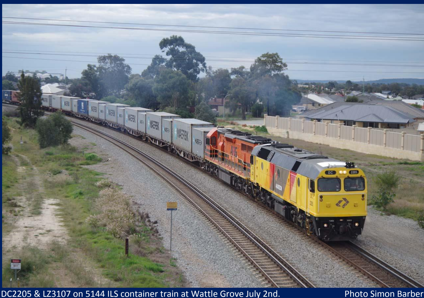
DC2205 & LZ3107 on 5144 ILS container train at Wattle Grove July 2nd.