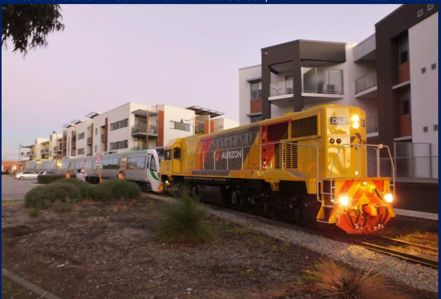
DAZ1901 hauls new EMU set 107 out of old workshops Midland for delivery to PTA 3/7.