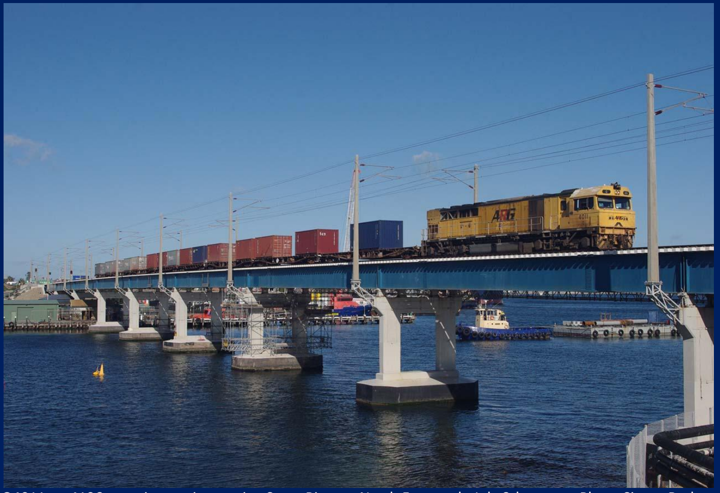
Q4011 on 4196 container train crossing Swan River at North Fremantle July 8th.