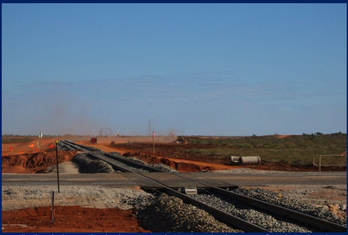
Roy Hill railway looking north at level crossing North West Coastal Highway west of Boodarie July 10th.