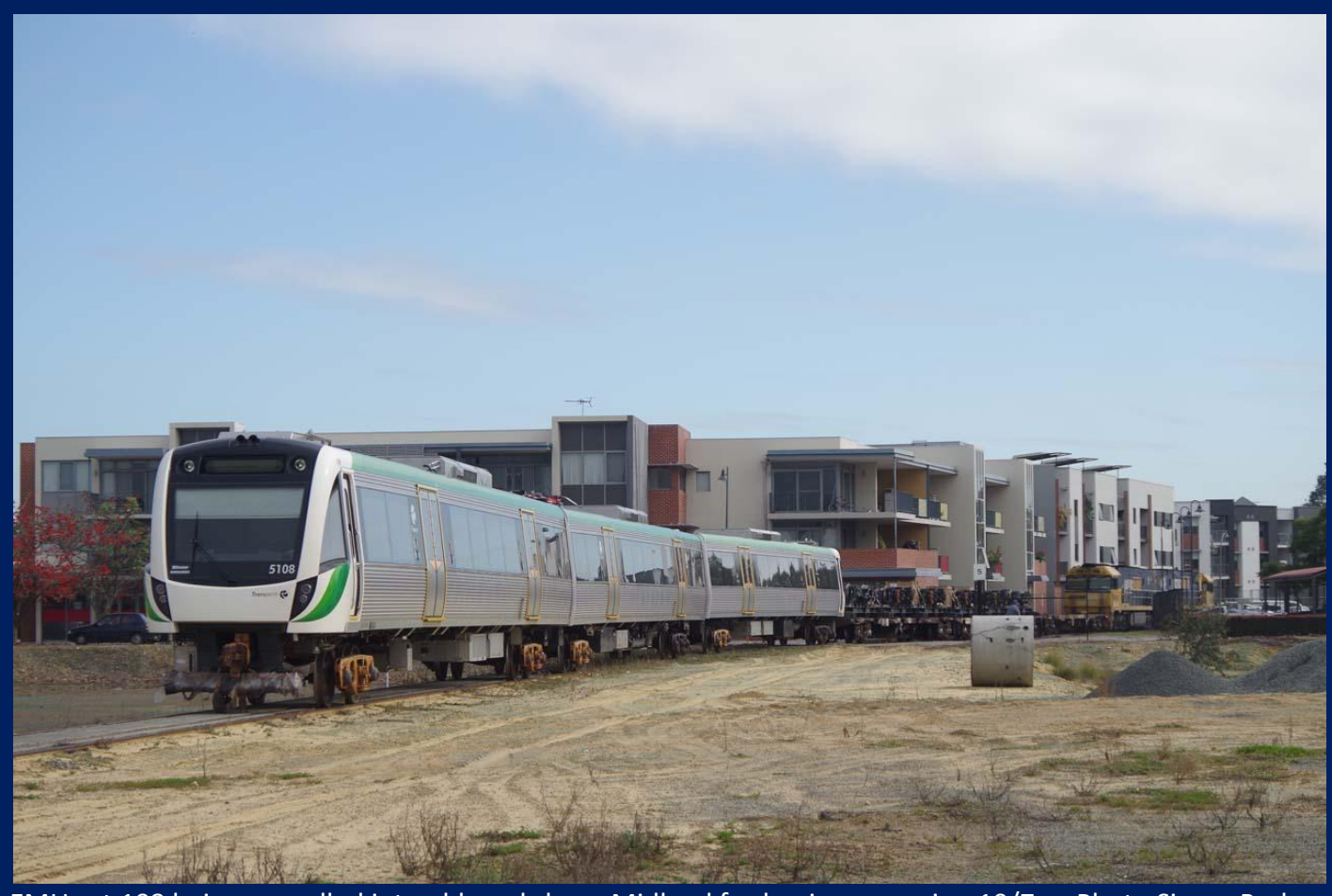
EMU set 108 being propelled into old workshops Midland for bogie conversion 10/7.