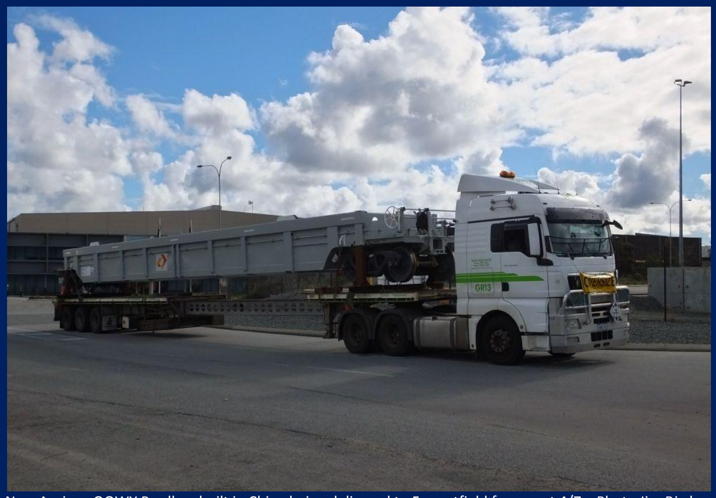
New Aurizon QQWY Bradken built in China being delivered to Forrestfield from port 4/7.