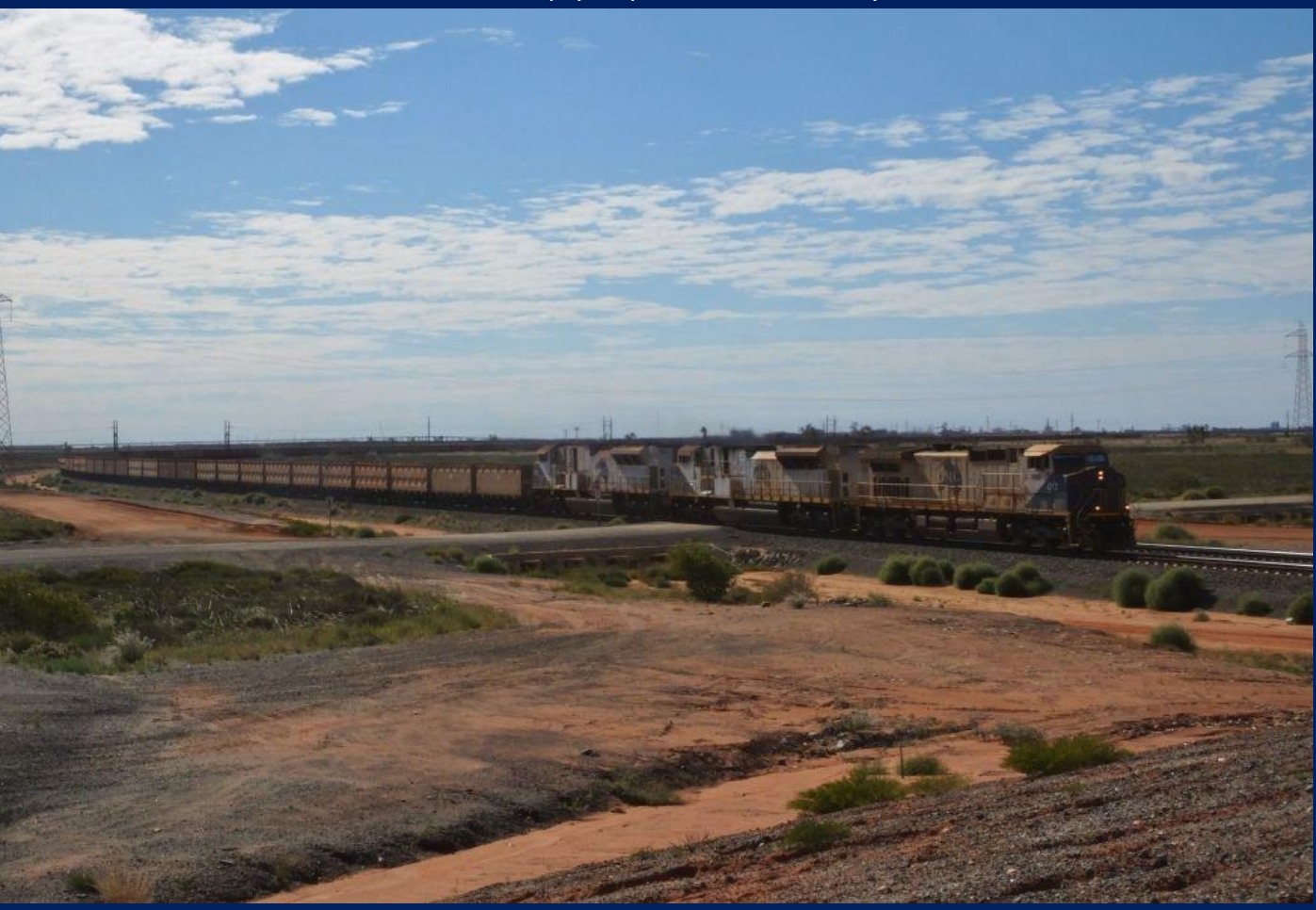
FMG 012, 915 & 907 on empty car rake ex port at Boodarie July 10th.