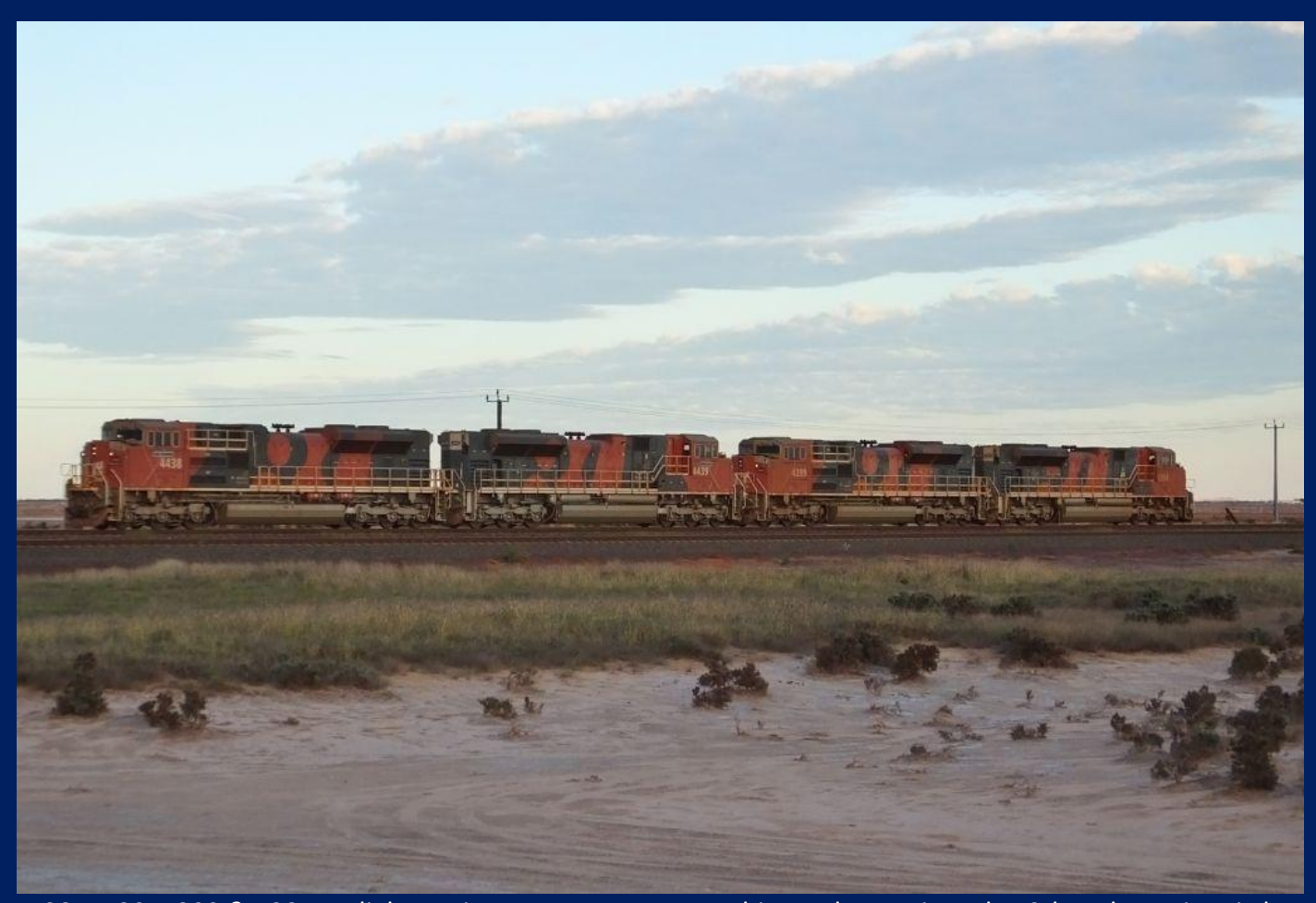
4438, 4439, 4399 & 4394 on light engine movement approaching Nelson Point July 10th.