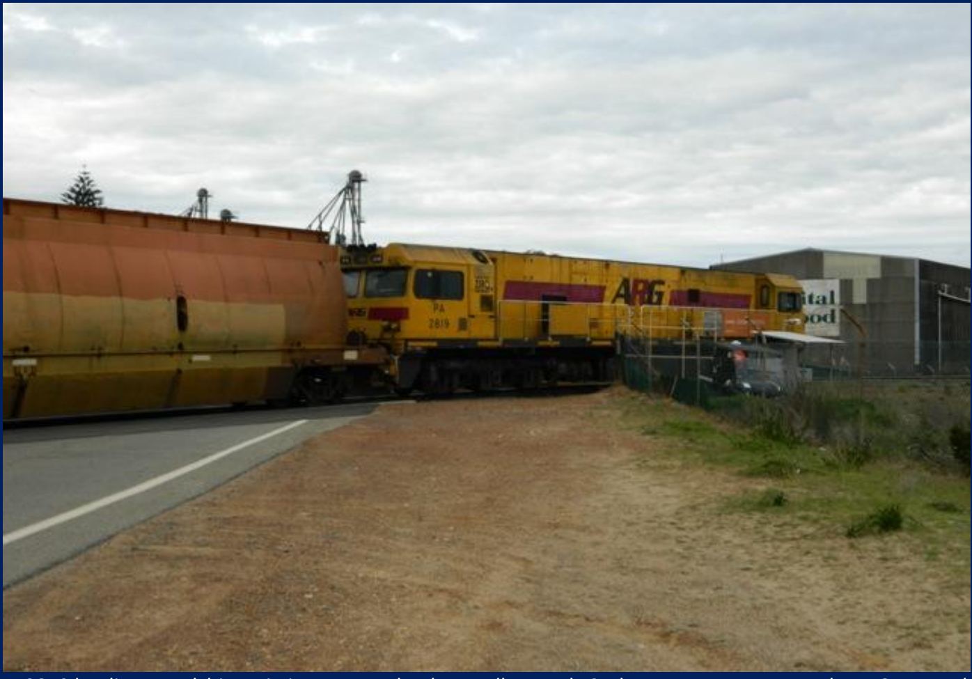
PA2819 hauling woodchip train into port unloader at Albany July 27th.