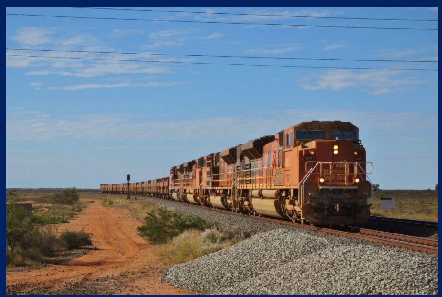
4401, 4339, 4463 & 4469 on short test train departing Port Hedland July 10th.