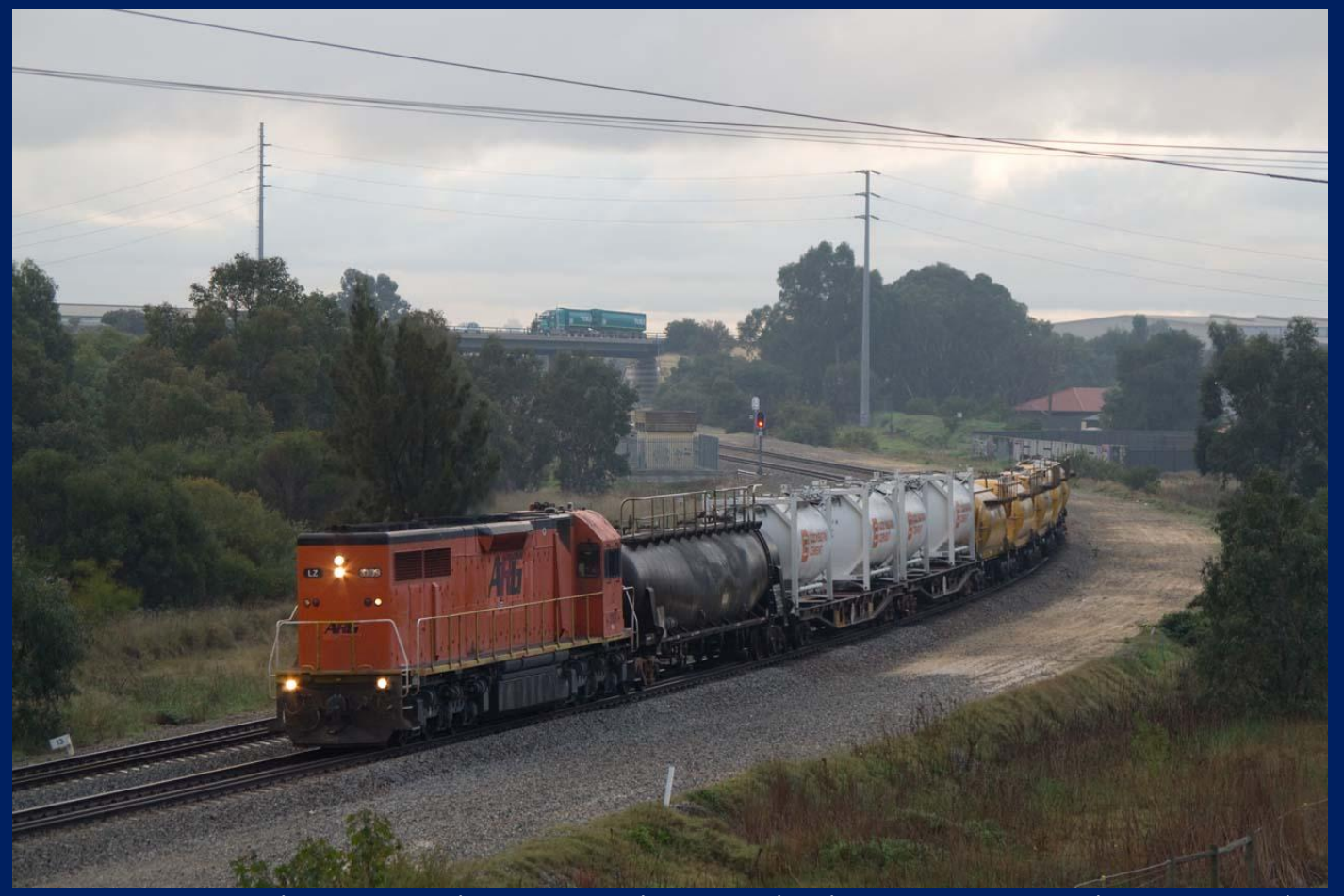
LZ3109 on 7194 Soundcem cement shunter at Wattle Grove July 4th.