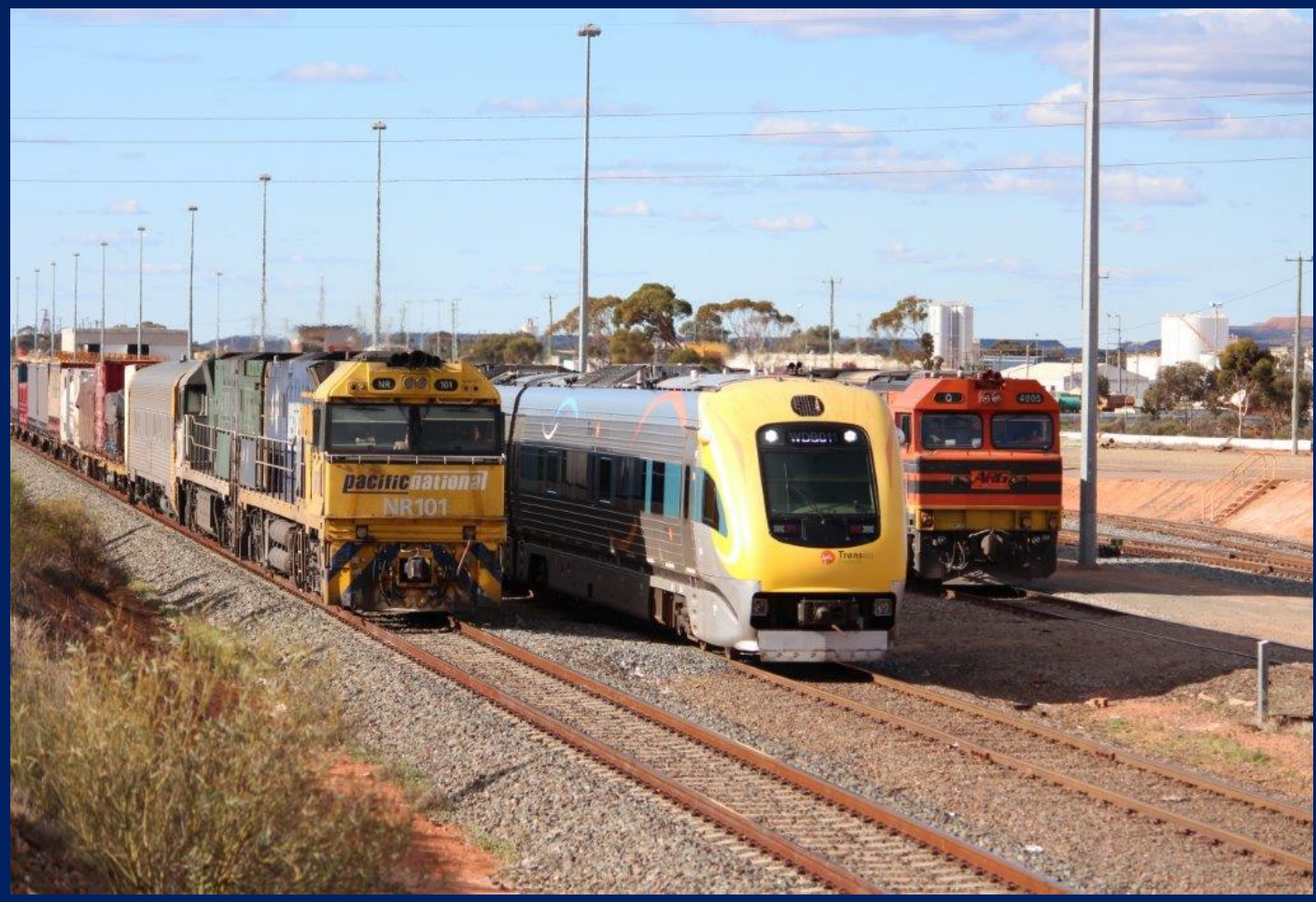
NR101 & NR84 on 6SP7 on main, 1484 Prospector bypassing on loop, Q4005 lead on 1426 at WEK July 5th.