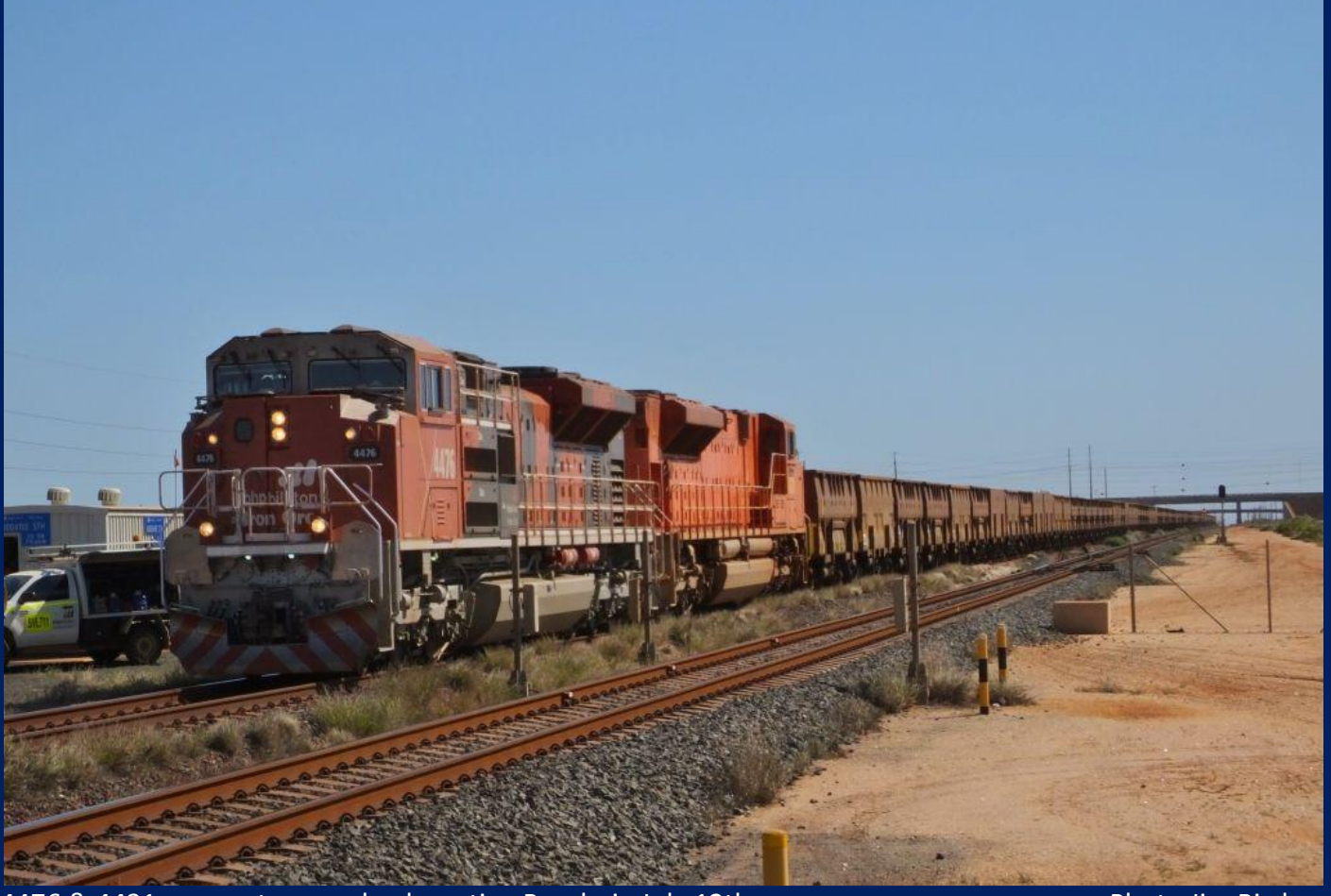
4476 & 4431 on empty ore rake departing Boodarie July 12th.