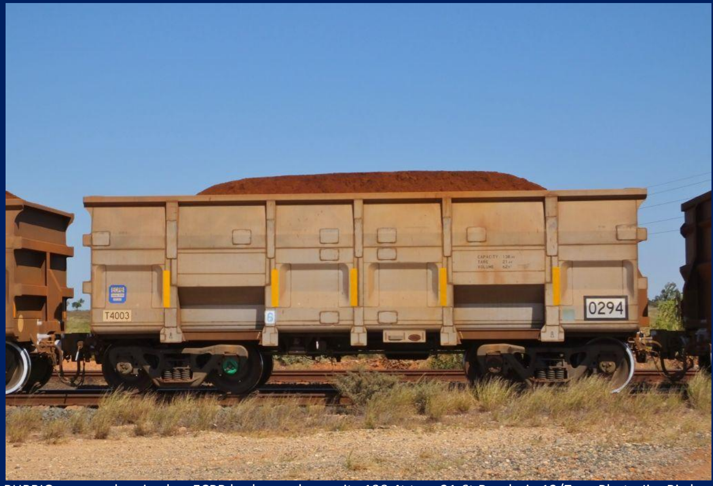
BHPBIO ore car showing has ECPB brakes and capacity 138.4t tare 21.6t Boodarie 12/7. Pho