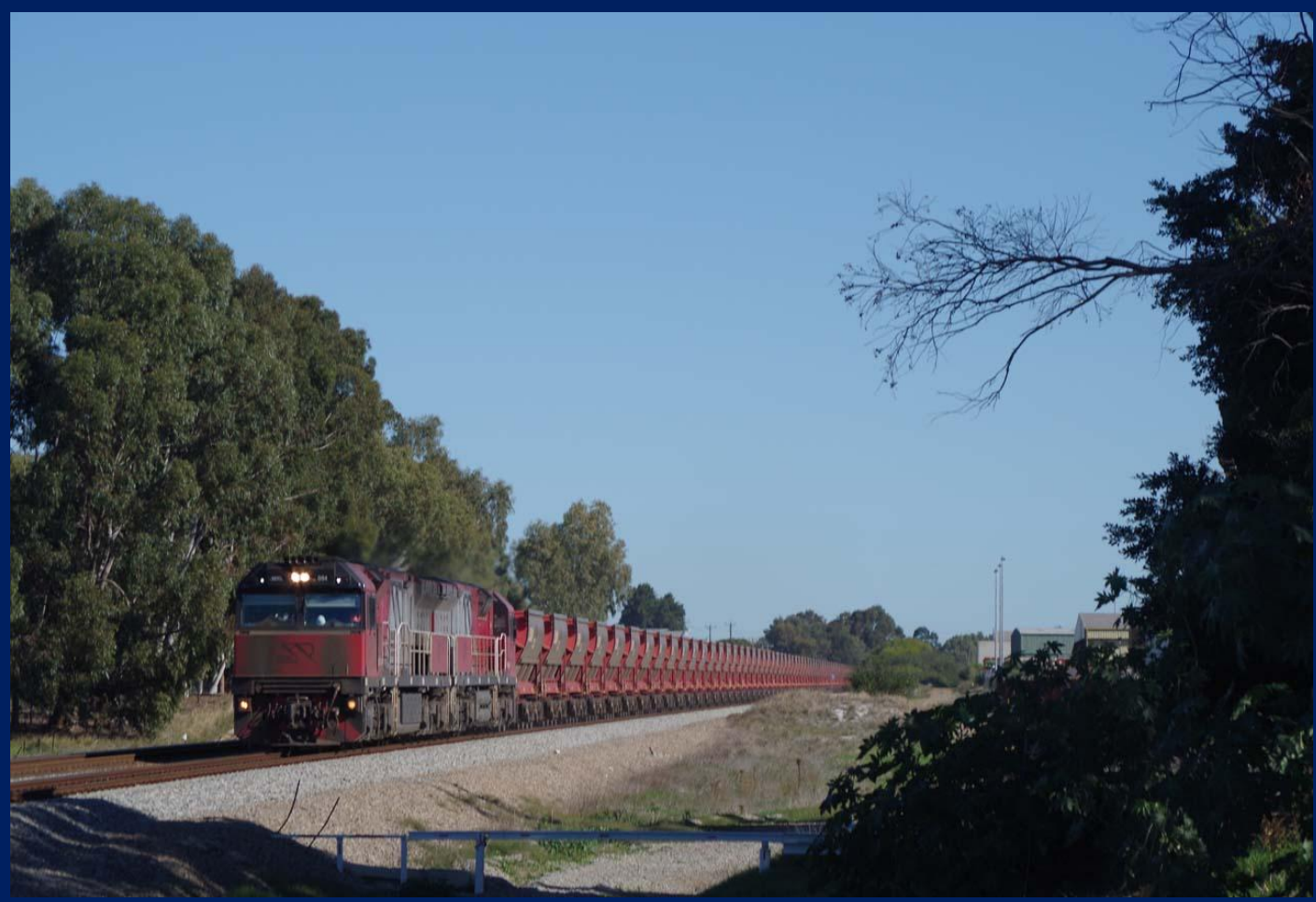
MRL004 & MRL002 on 1035 empty Polaris ore at Canning Vale June 28th.