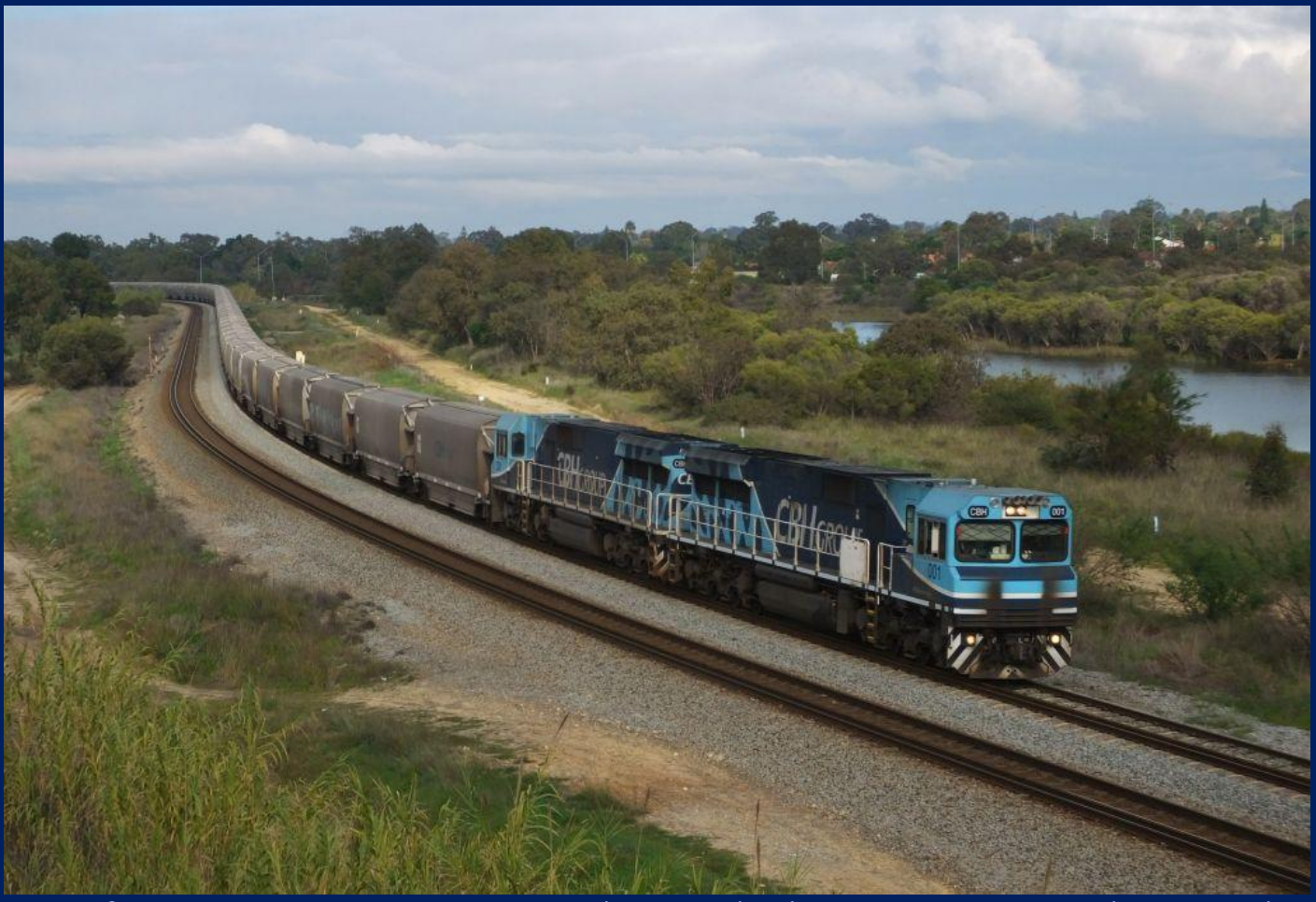
CBH001 & CBH024 on empty Watco grain at Wattle Grove July 4th.