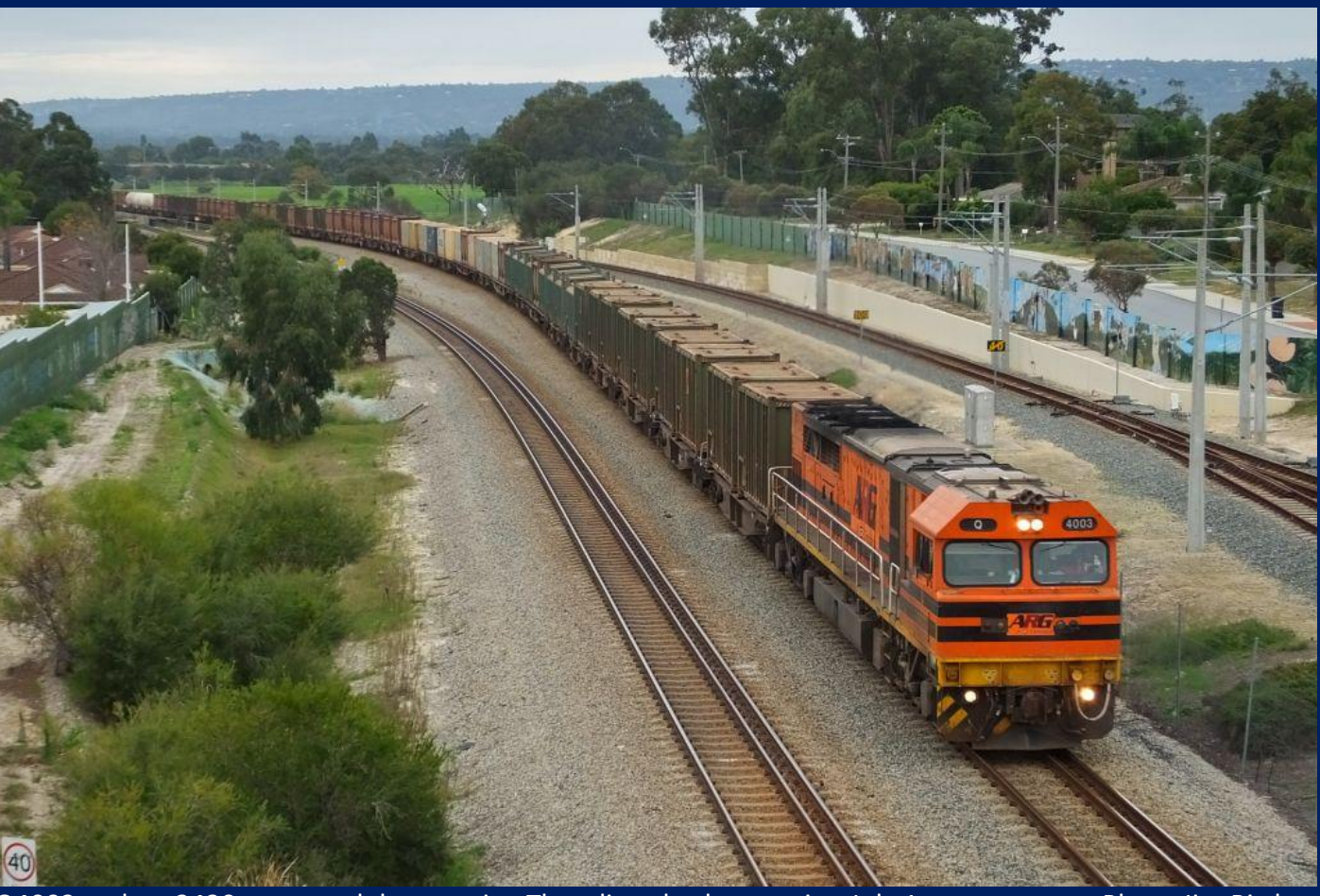
Q4003 on late 3430 empty sulphur passing Thornlie suburban station July 1st.