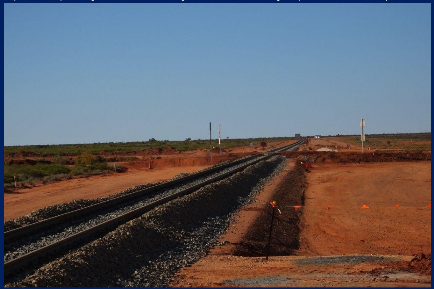
Roy Hill railway looking south from North West Coastal Highway crossing July 10th.