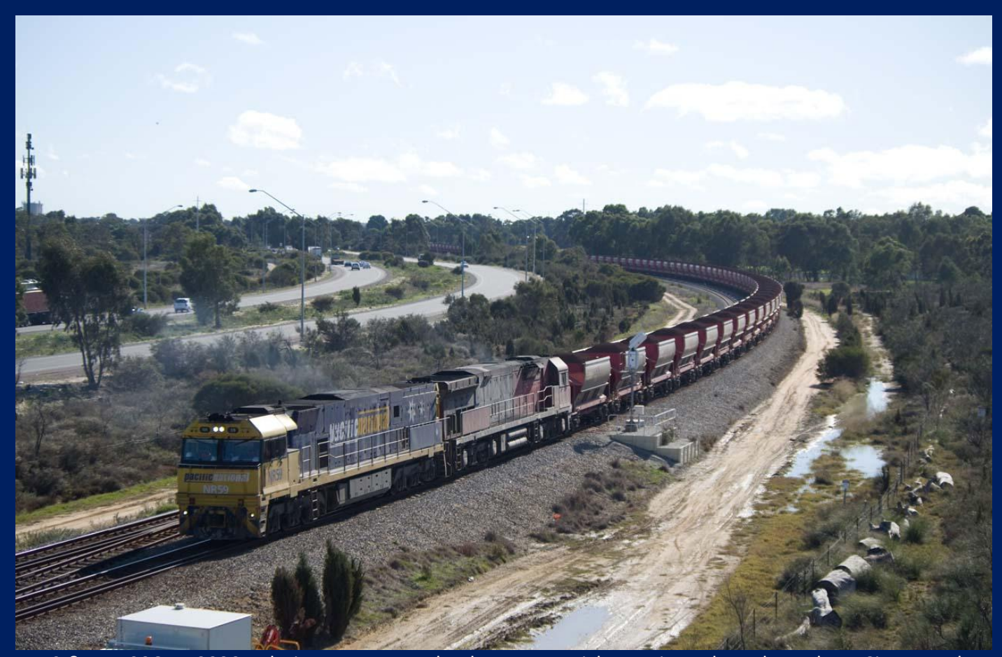
NR59 & MRL006 on 3030 Polaris ore to KBT unloaders at Kenwick Junction July 15th.