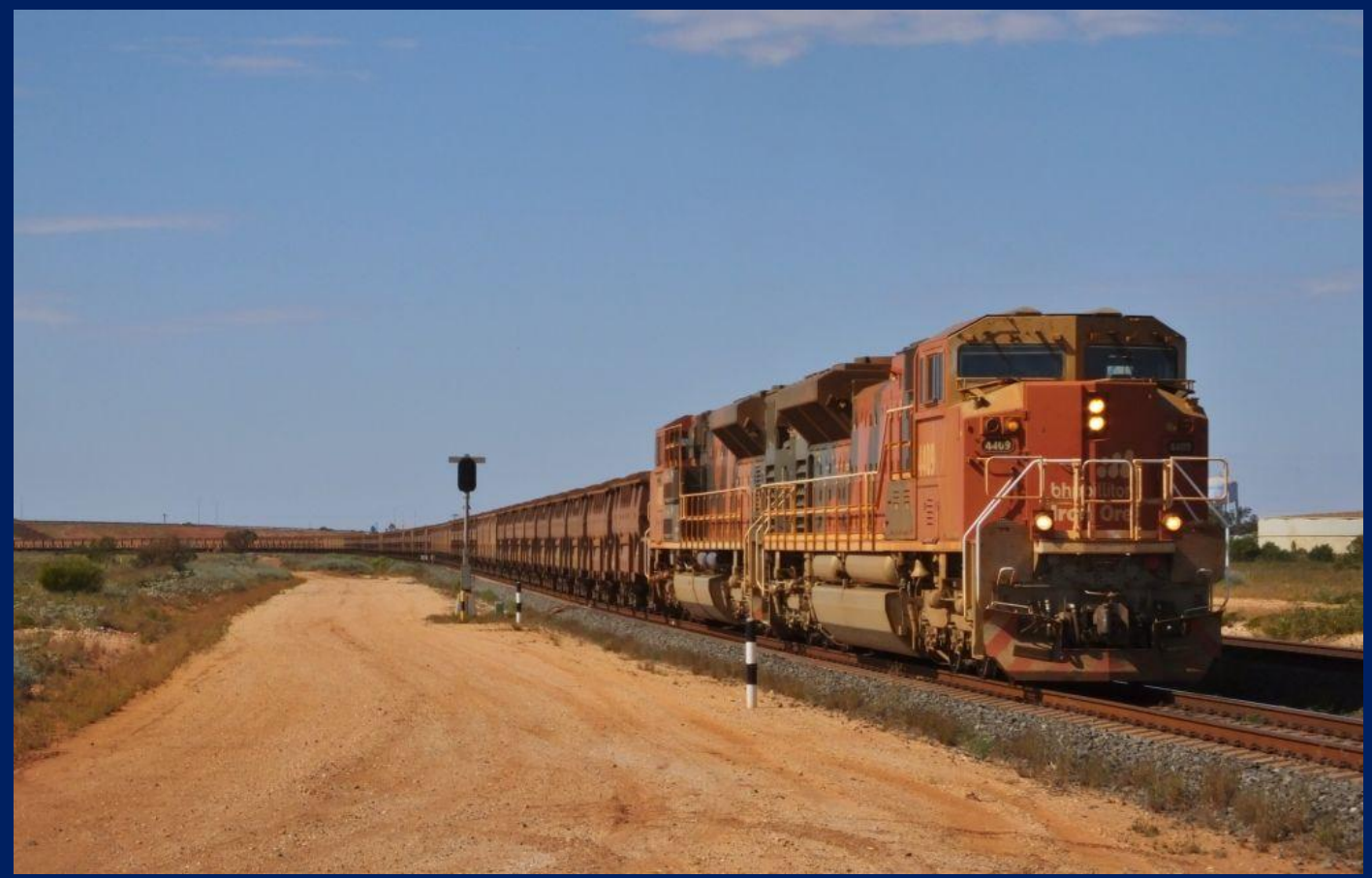
4409 & 4317 on loaded ore approaching Boodarie on way to Finucane Island July 12th.