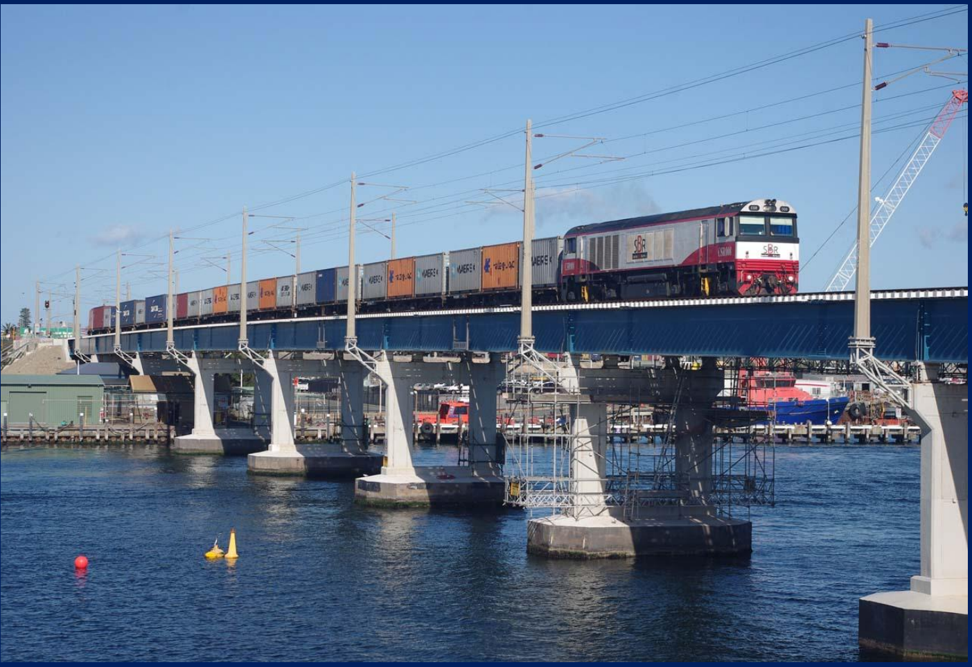
CSR008 on 4144 ILS container train crossing Swan River at North Fremantle July 8th.