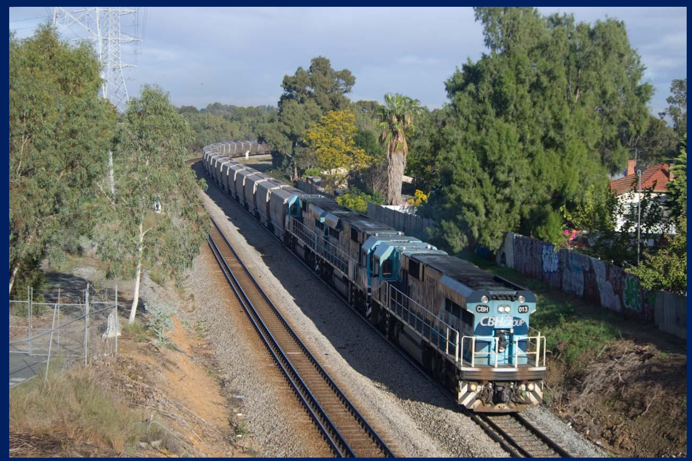
CBH013, CBH008 & CBH005 on 1K65 empty Watco grain Bellevue July 5th.