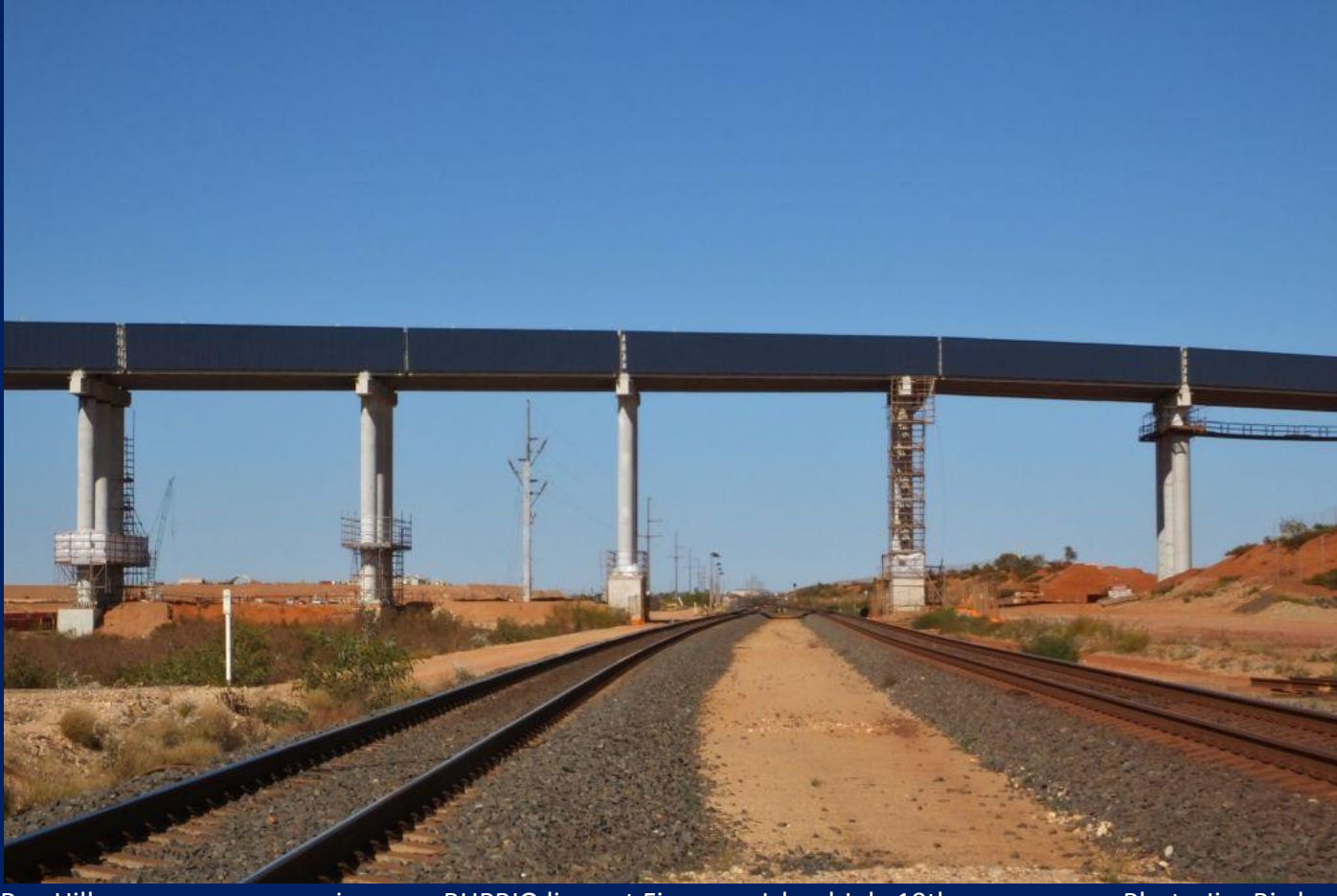
Roy Hill ore conveyor crossing over BHPBIO lines at Finucane Island July 10th.