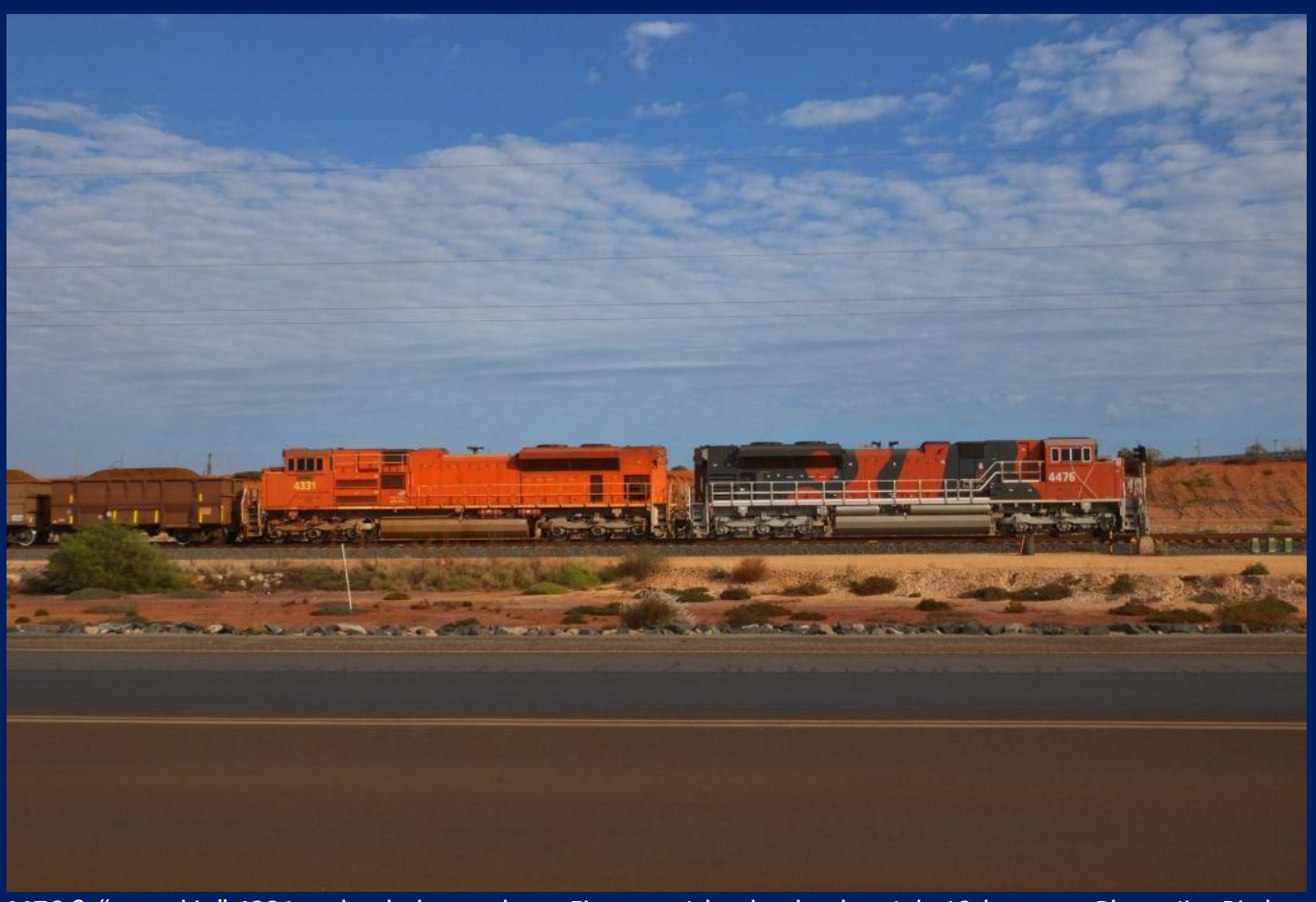
4476 & "pumpkin" 4331 on loaded ore rake to Finucane Island unloaders July 12th.