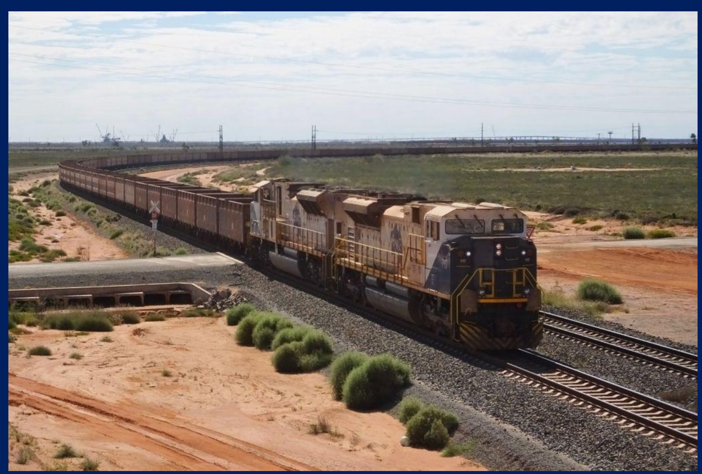
FMG SD70ACe 717 & SD9043MAC 905 on empty ex port at Boodarie July 10th.