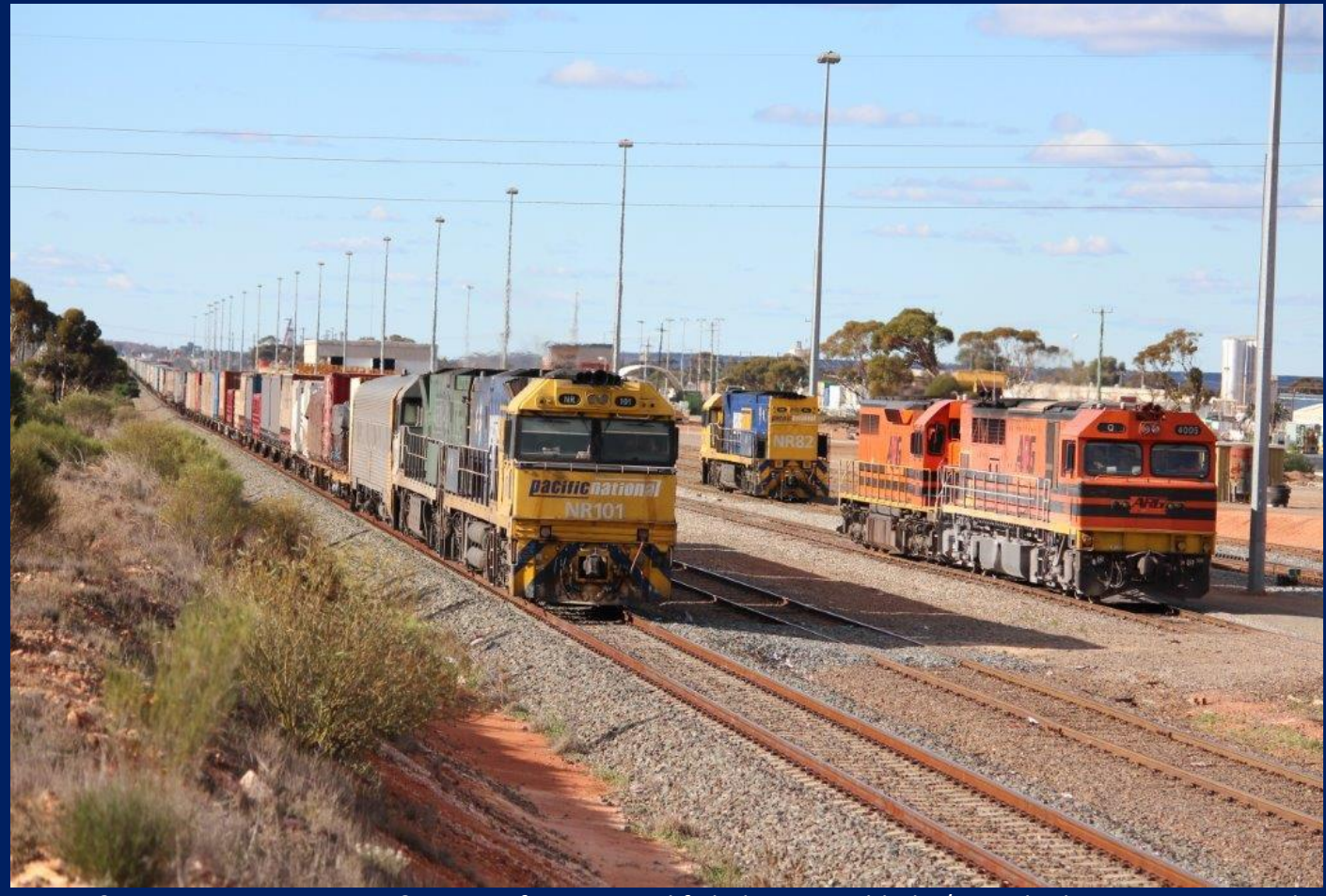
NR101 & NR84 on 6SP7, Q4005 & LZ3109 for 1426 and failed NR82 stabled 5/7.