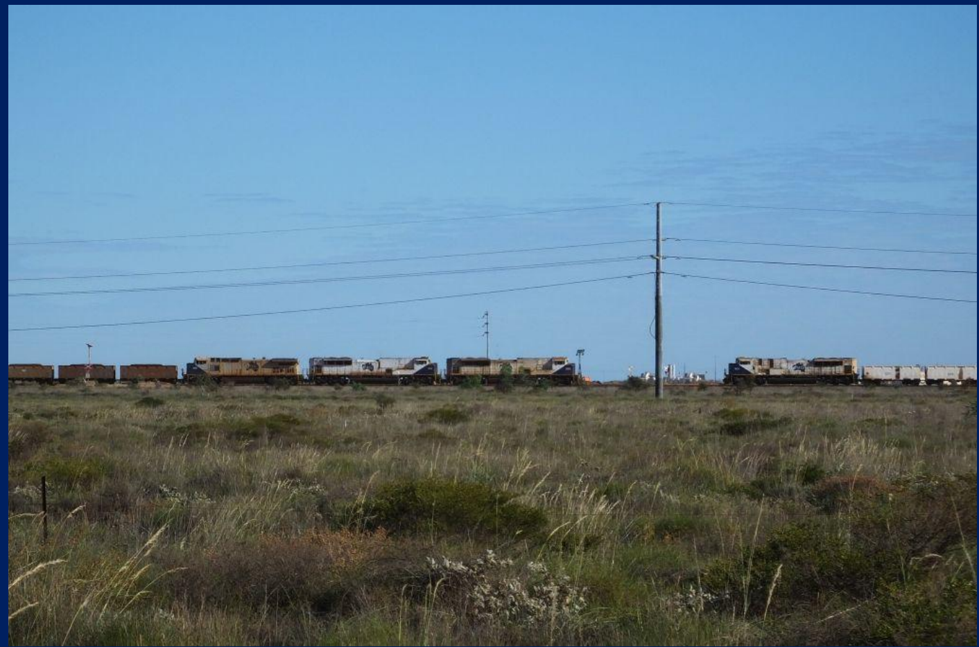
FMG SD9043MAC 909, SD90MAC 913 & CW44-9W 006 on loaded cross 901 at port 10/7.