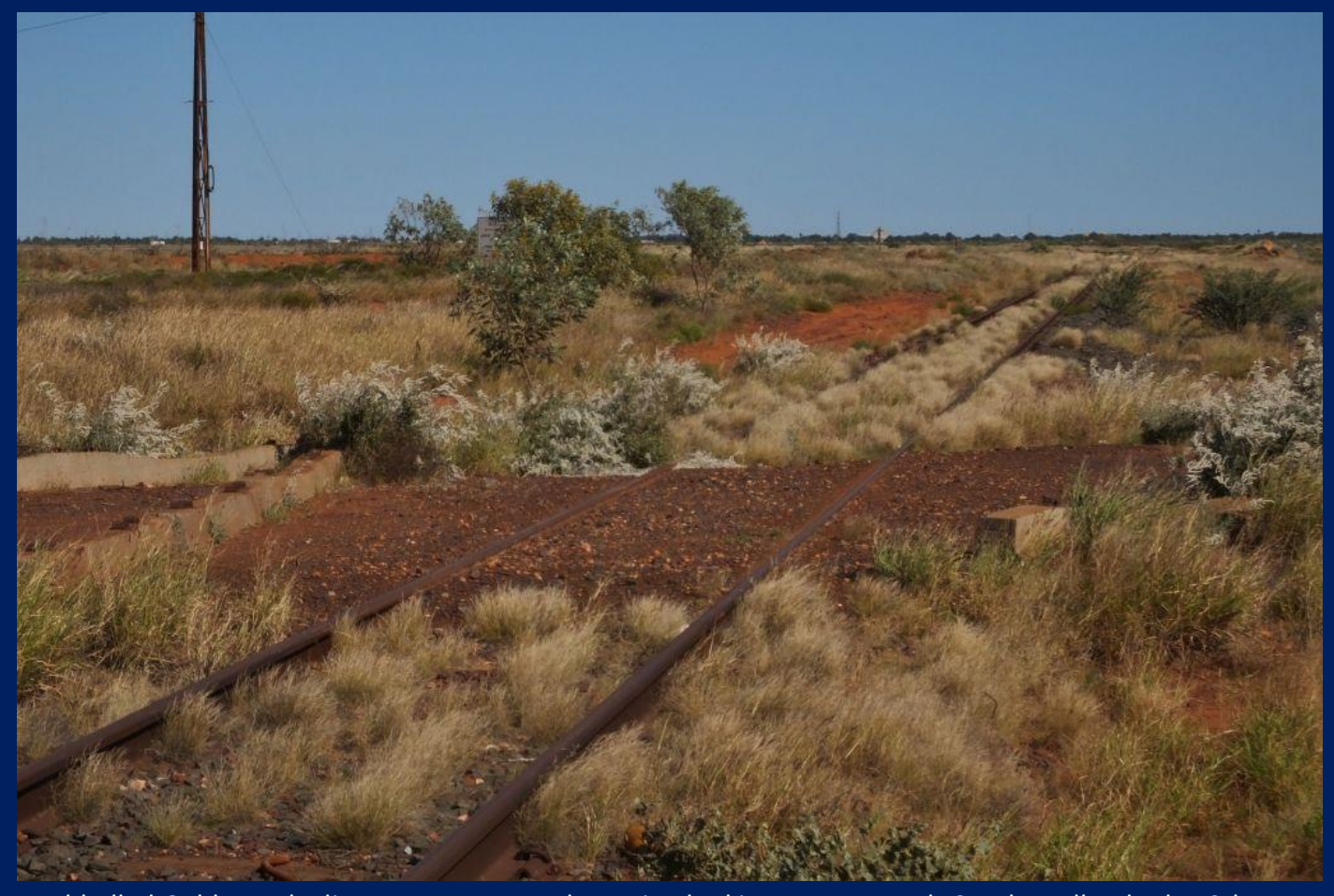
Mothballed Goldsworthy line at Broome Road crossing looking west towards South Hedland July 10th.