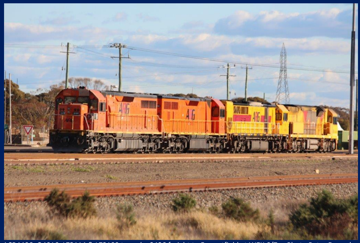
ACB4406, Q4016, LZ3114 & LZ3109 to make 2426 freight to Forrestfield at WEK 6/7.