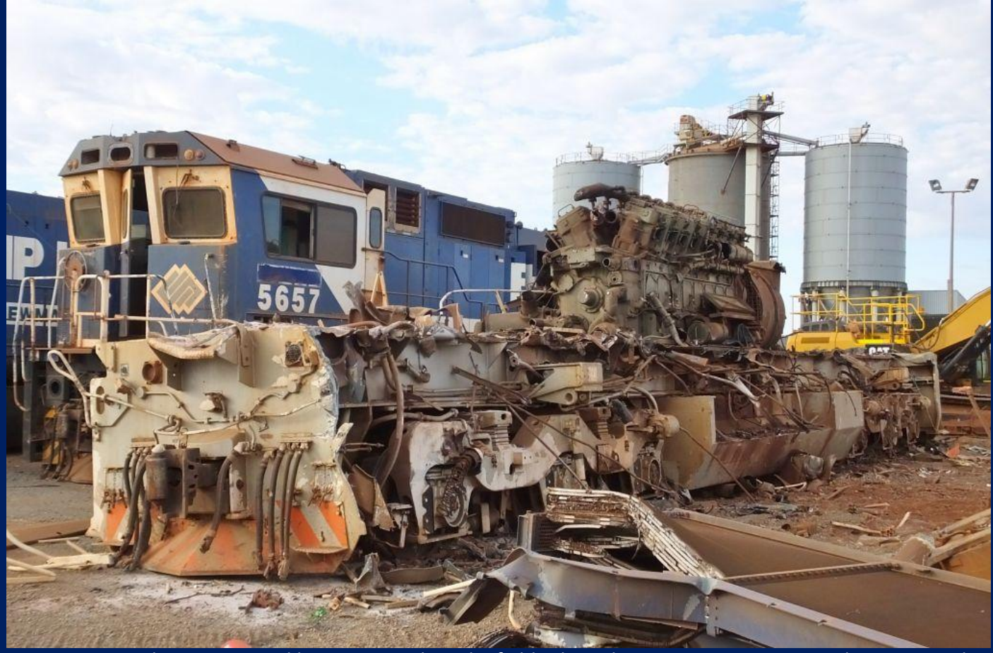
CM40-8M 5646 being scrapped by Sims Metal Wedgefield July 12th.