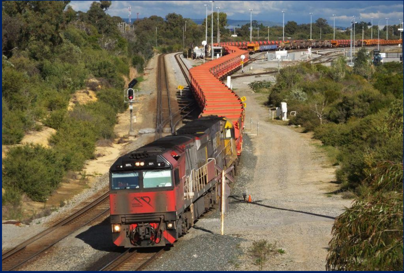
MRL001 & NR114 on 7035 empty Polaris ore departing Forrestfield July 4th.