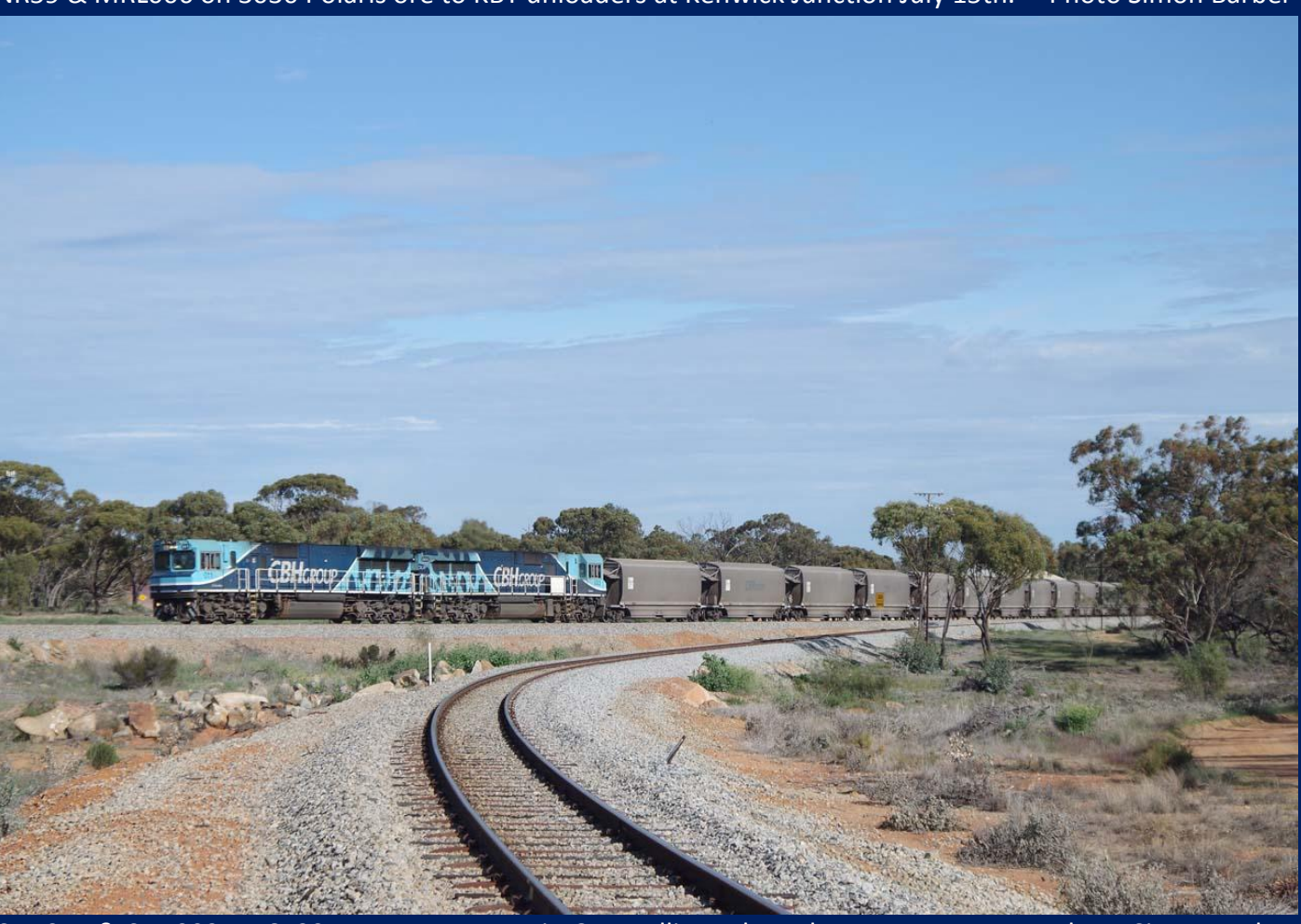
CBH011 & CBH003 on 6K33 empty Watco grain Goomalling July 17th.