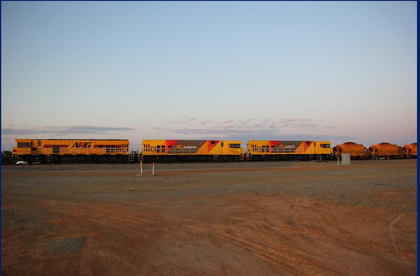
P2514, P2504 & P2505 on Mt Gibson ore at Northern Gully after sun set 17/9.