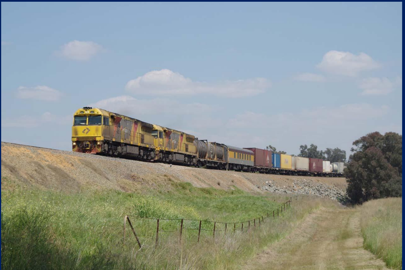
6024 & 6025 on 7PM1 Aurizon intermodal at Millendon September 26th.