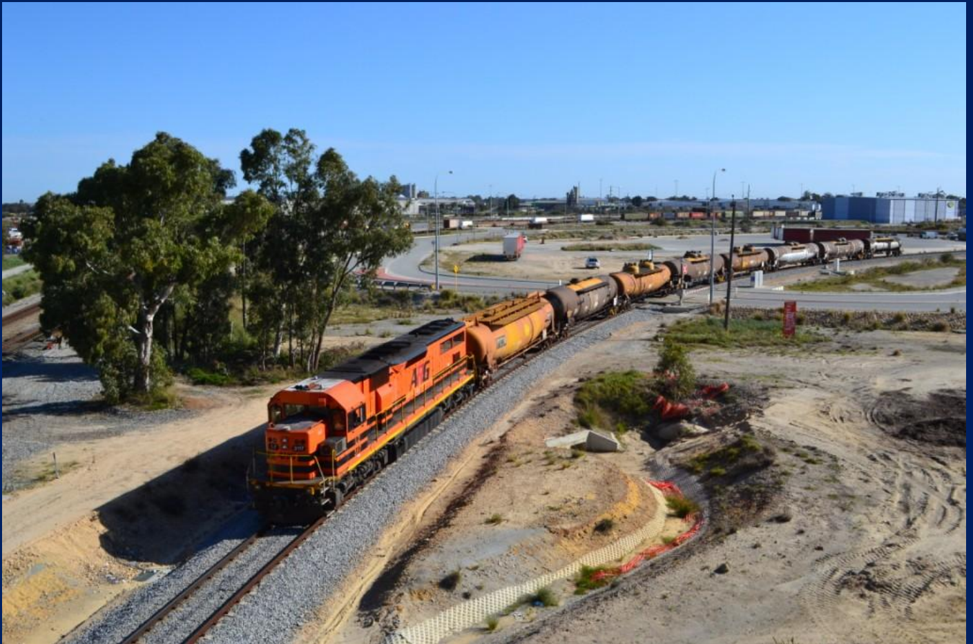
LZ3117 on 4SG4 shunter with tankers from BP Kewdale on North Service West 9/9.