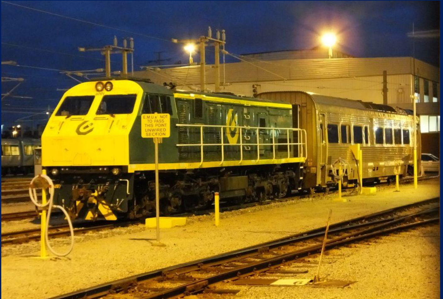
U201 and ADQ121 stabled at Claisebrook Railcar Depot on evening September 4th.