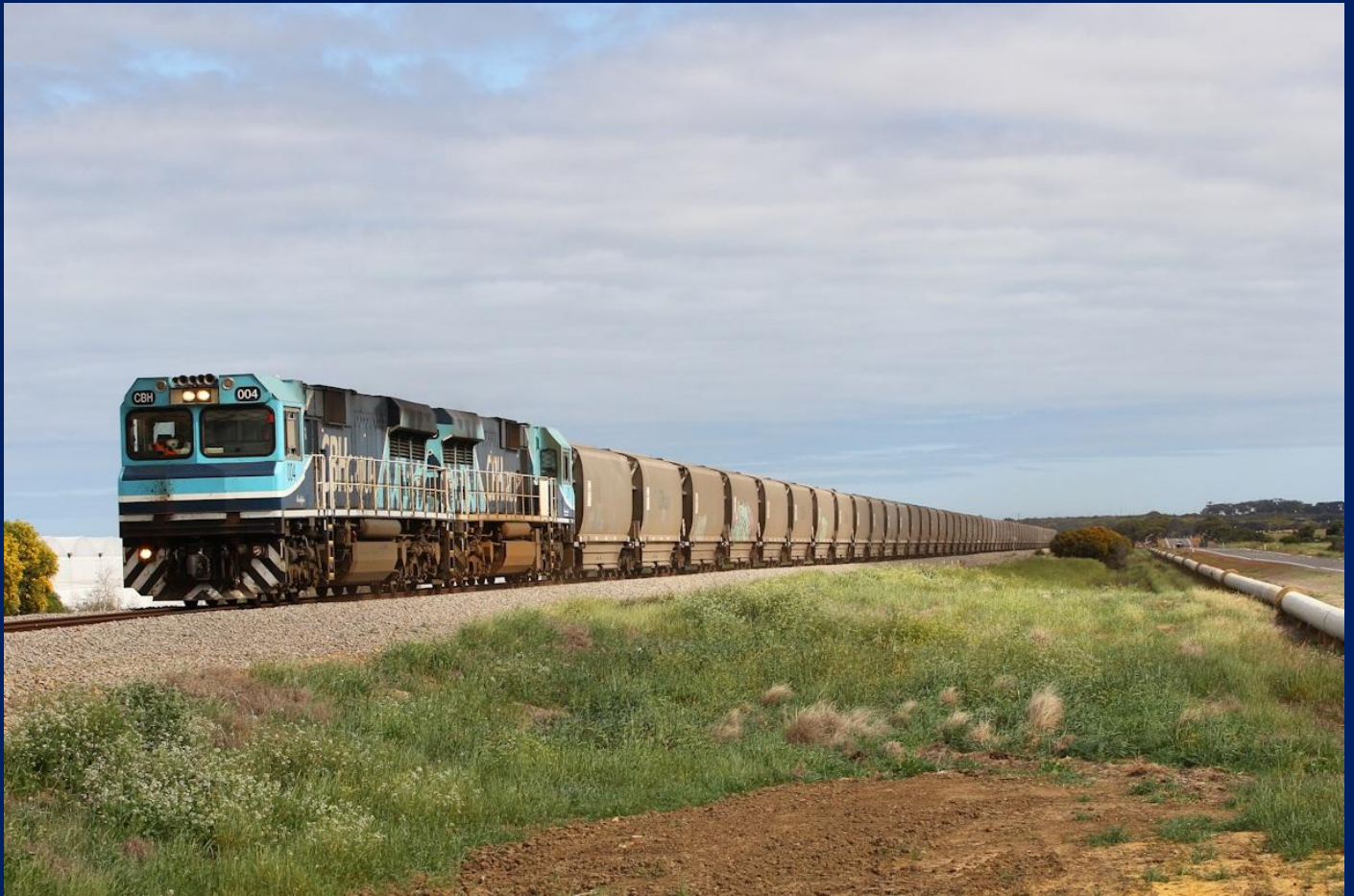
CBH004 & CBH010 on 7G50 empty Watco grain Mingenew passing thru Bootenal 19/9.