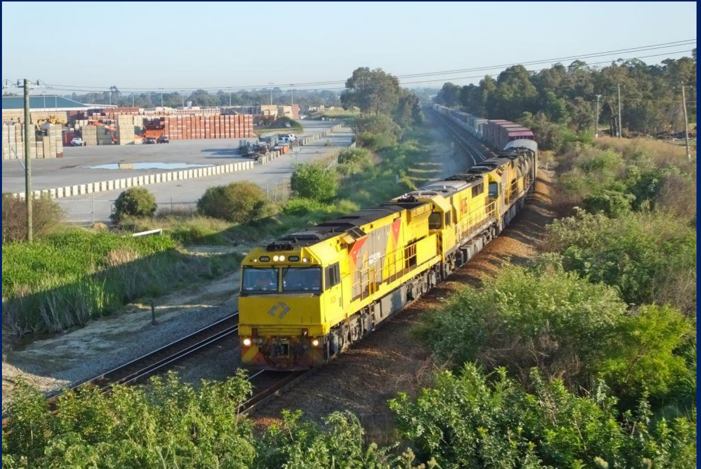
6026, Q4017 & 6025 on late 3MP1 Aurizon intermodal South Guildford September 18th.