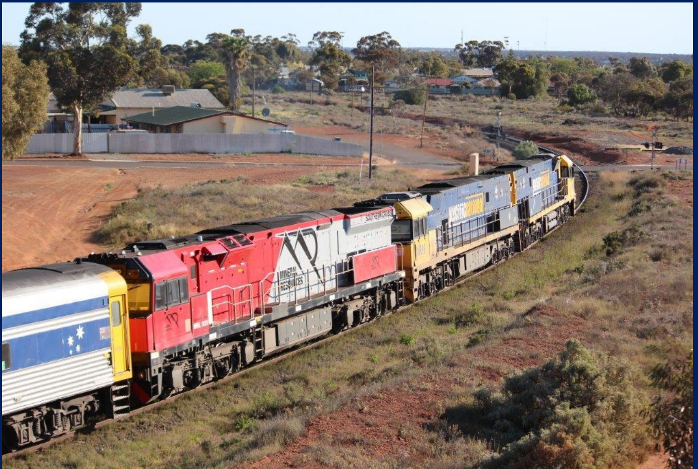
NR10, NR98 & MRL003 on 2MP5 intermodal about to enter Kalgoorlie 23/9.