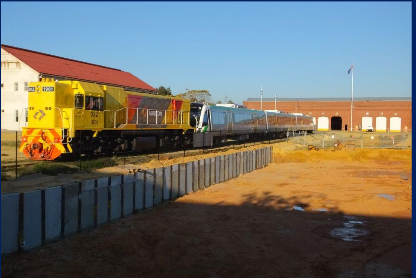
DAZ1901 hauls B series EMU set 109 past what will be an apartment block in old workshops yard Midland