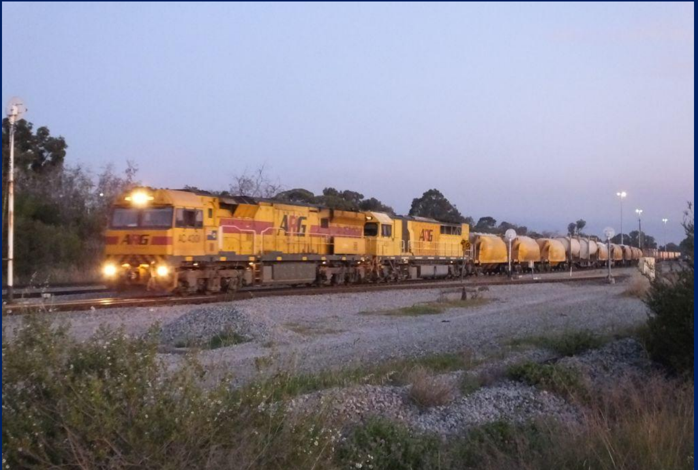
AC4301 & Q4011 on 1025 departing Forresterfield after sundown on September 27th.