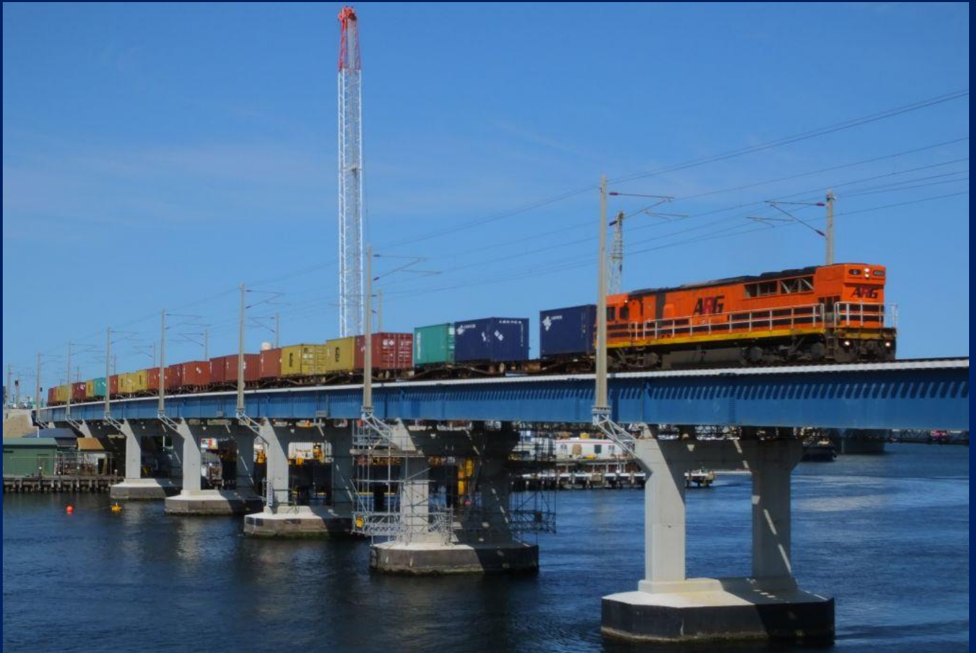
Q4003 on 3196 container train to North Port crossing Swan River on Fremantle Rail Bridge 22/9.