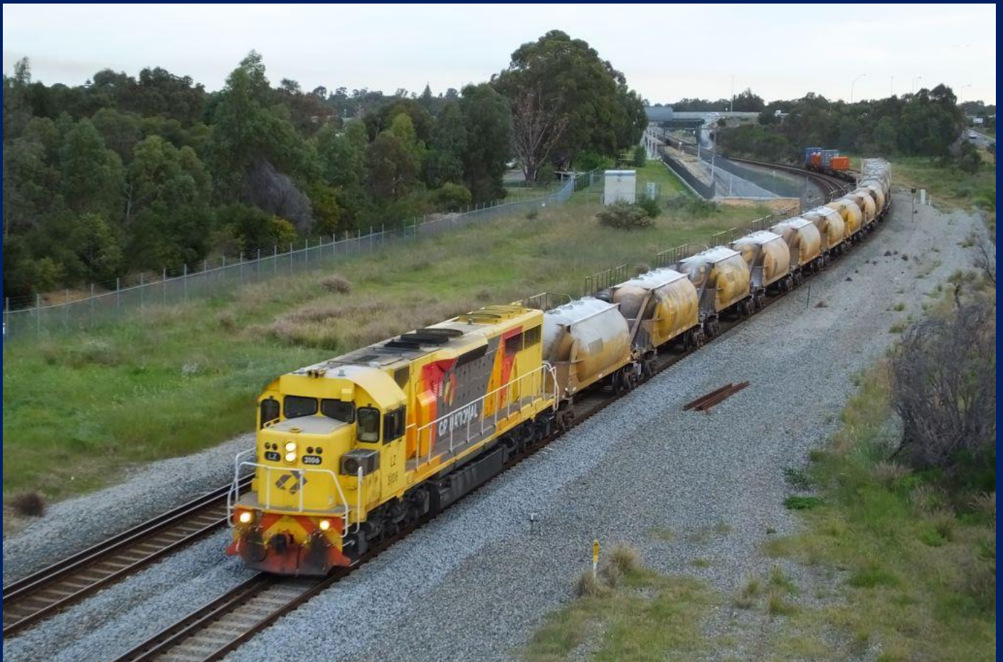
LZ3106 on 5197 Soundcem shunter with North Port loading at Kenwick 24/9.