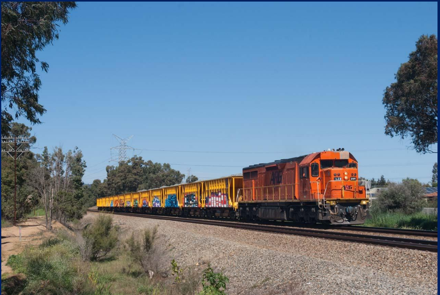
LZ3109 on 4BT1 ballast at Swan View on September 9th.