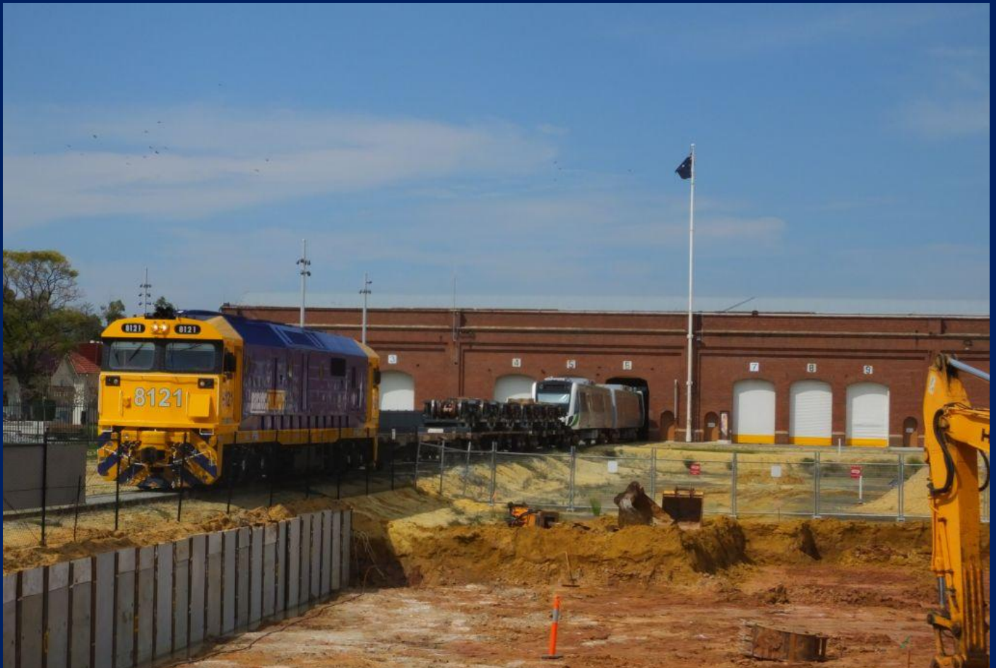
8121 propels new EMU set 110 into old workshops past new construction site 18/9.