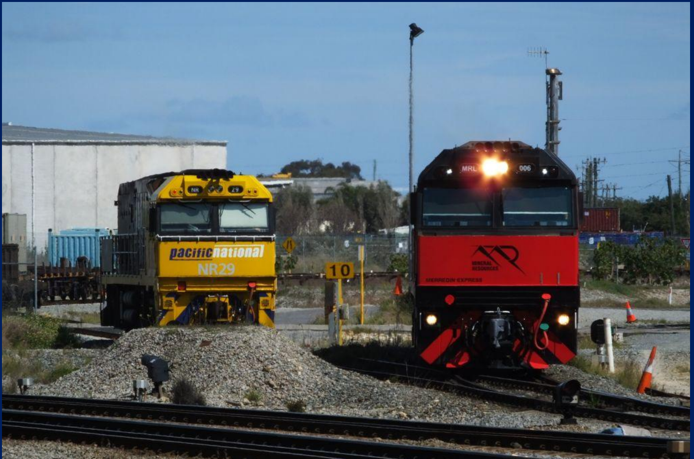
NR29 yard shunter stabled Kewdale being passed by engine turn MRL006 leading 4/9.