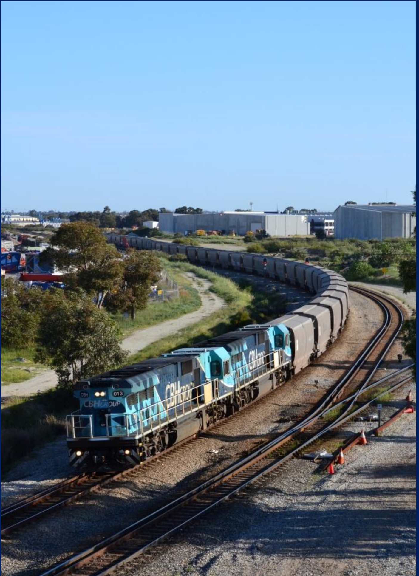
CBH013 & CBH014 on empty Watco grain on main line passing thru Kewdale 9/9.