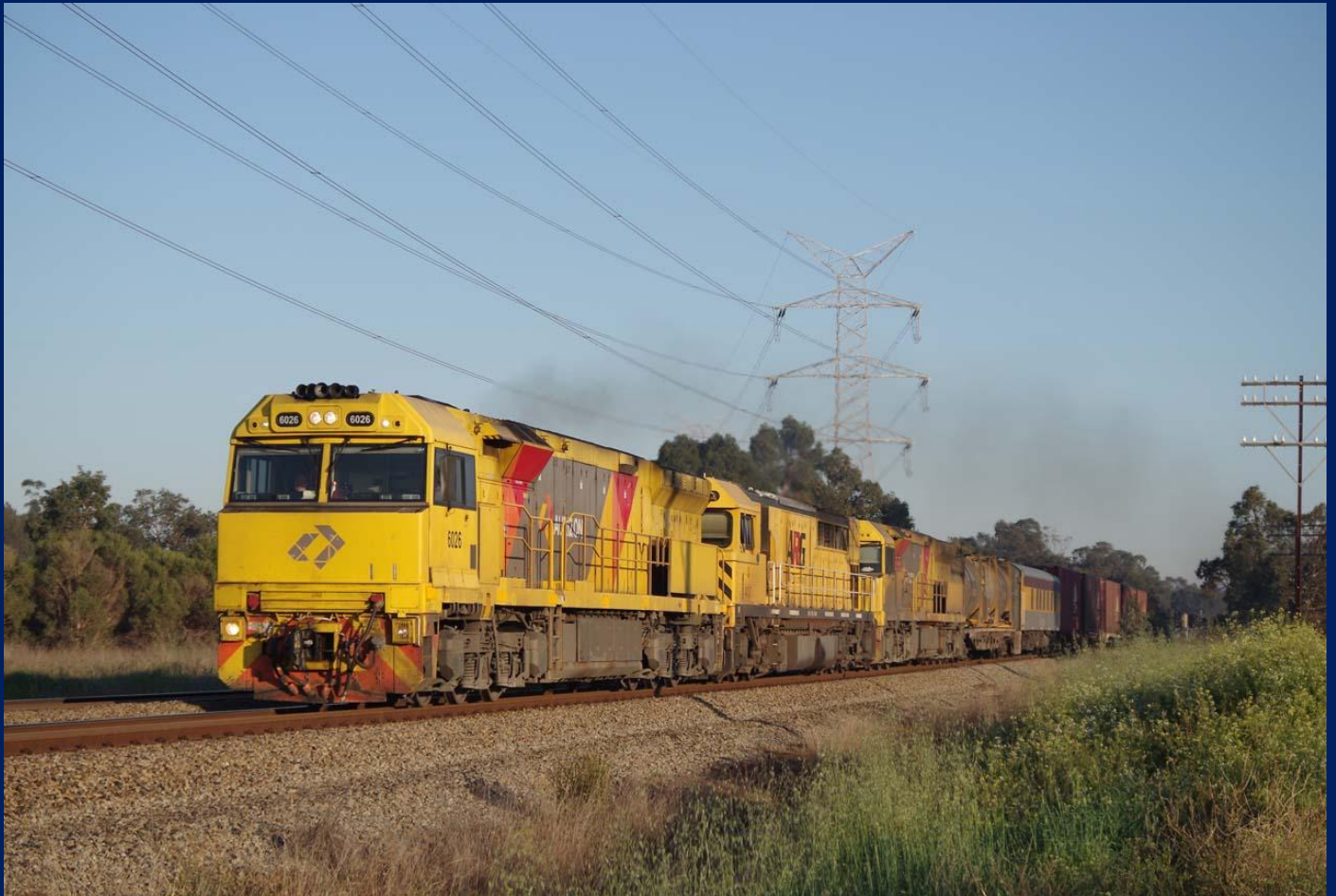
6026, Q4017 & failed 6025 on late 3MP1 Aurizon intermodal at Middle Swan 18/9.