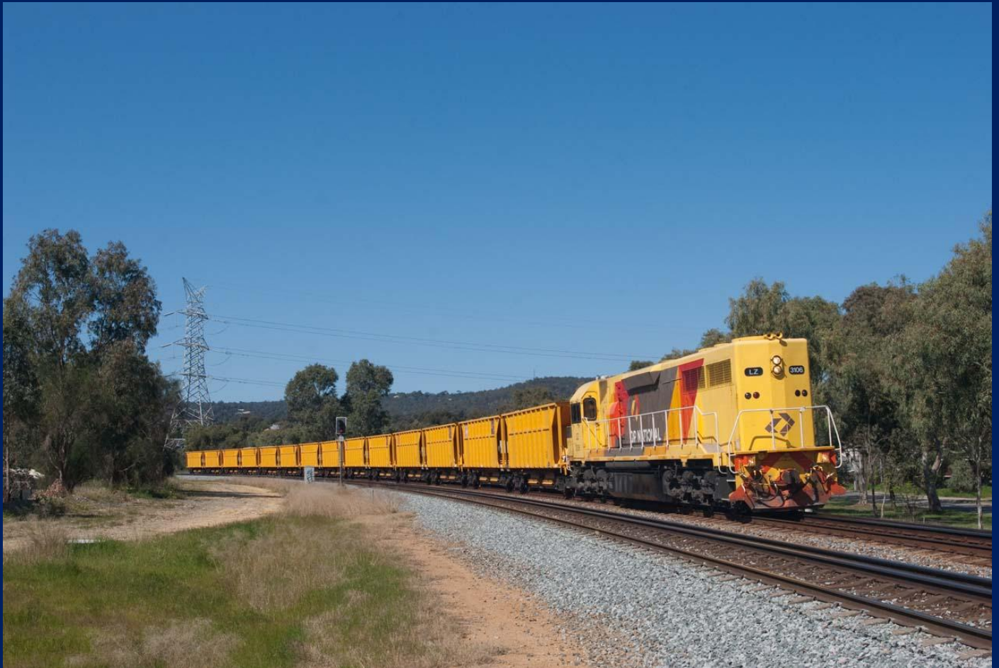
LZ3106 on 2BT2 empty ballast at Bellevue September 7th.