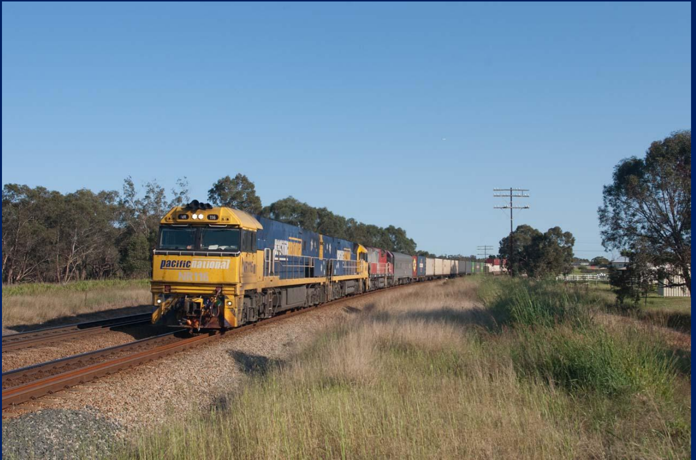
NR116, NR63 dead MRL006 returning to WA on 6MP5 Middle Swan September 21st.