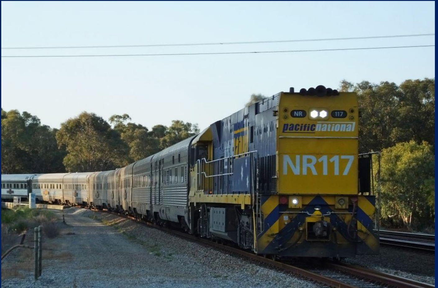
NR117 on 3003 empty Indian Pacific cars East Perth to Kewdale at Woodbridge 8/9.