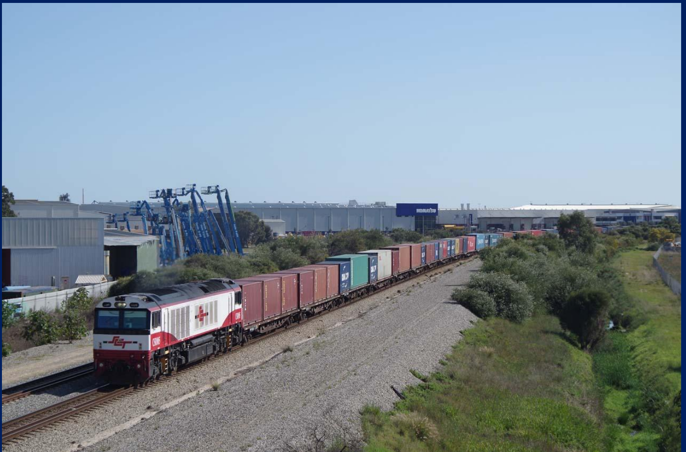
CSR005 on 1142 ILS intermodal to North Port at Kewdale September 6th.