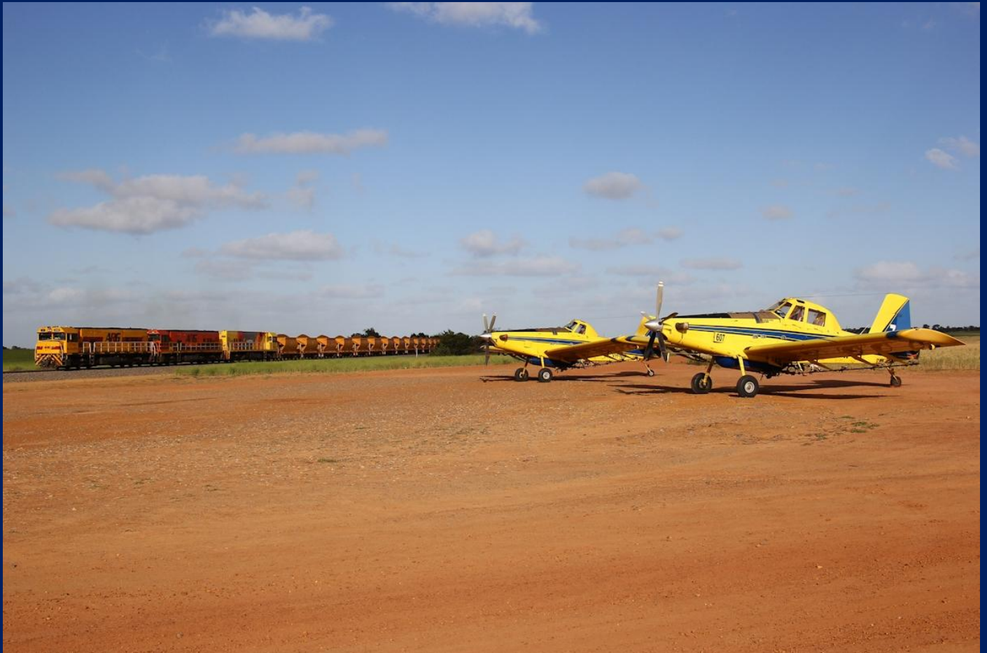
P2514, P2503 & P2505 on 7725 Mt Gibson ore passing crop spraying planes Indarra 12/9.