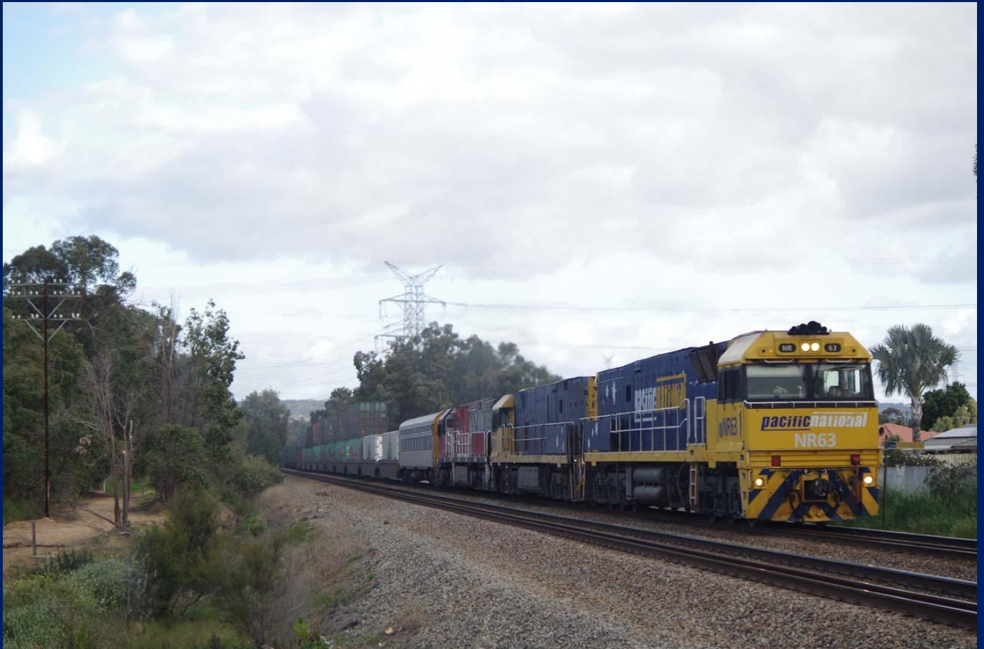
NR63, NR48 & hauling dead MRL006 interstate for work on 1PM5 at Swan View 13/9.