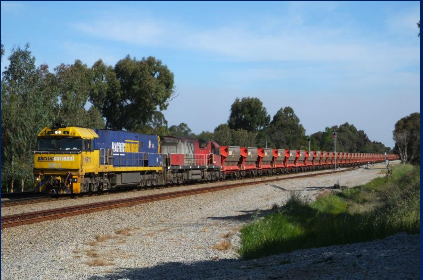
NR11 & MRL005 on 1035 empty Polaris ore at Woodbridge September 27th.