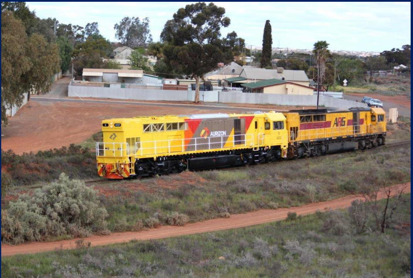
Q4001 & Q4015 on 1C73 light engine Parkeston shunter departing Kalgoorlie 13/9.