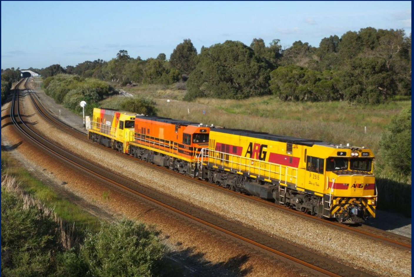
P2515, P2506 & P2504 on 6755 light engine Forrestfield to Narngulu South Guildford 4/9.