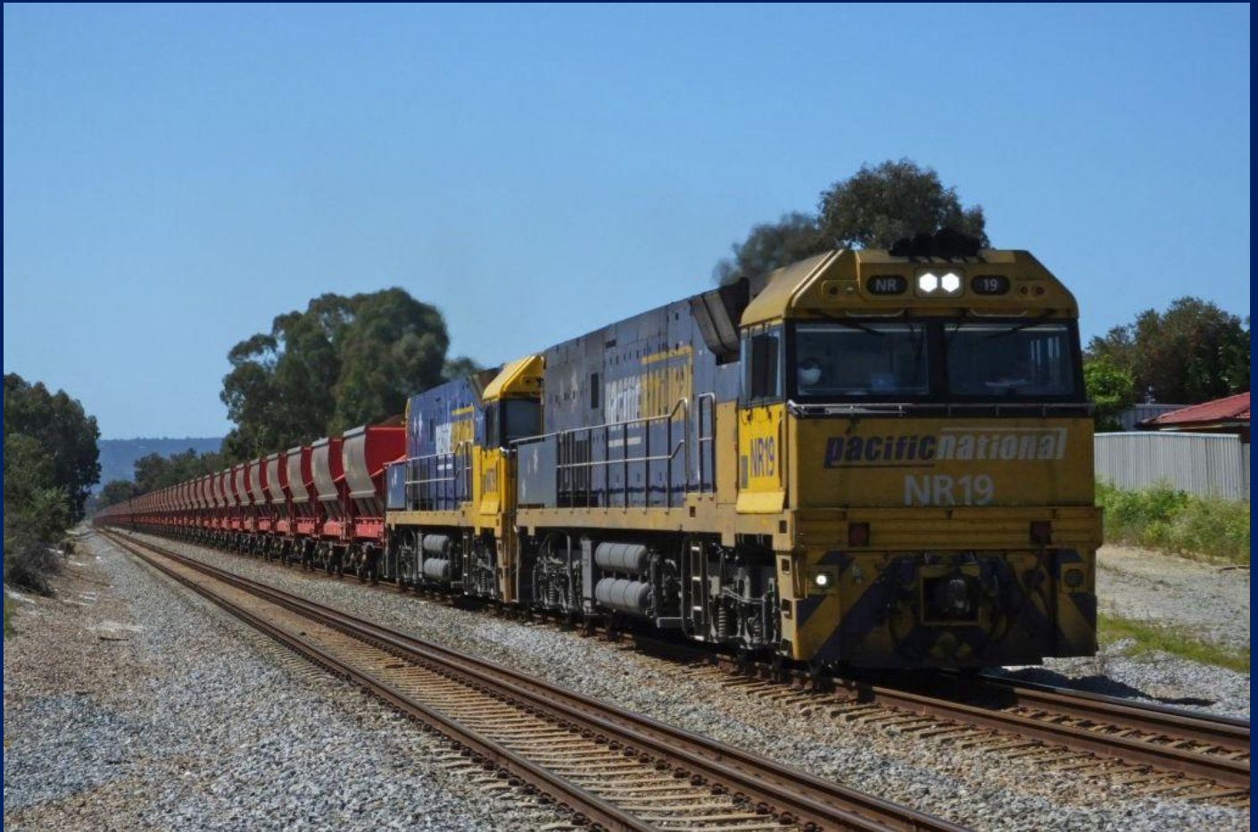
NR79 & NR79 on late 2034 Polaris ore [MRL001 failed NR79 replaced it] at Thornlie 15/9.