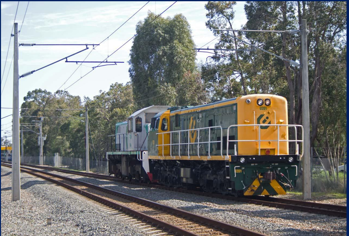
U201 hauling MA1862 on 4PL3 light engine movement to deliver the MA to the HVTR September 9th.