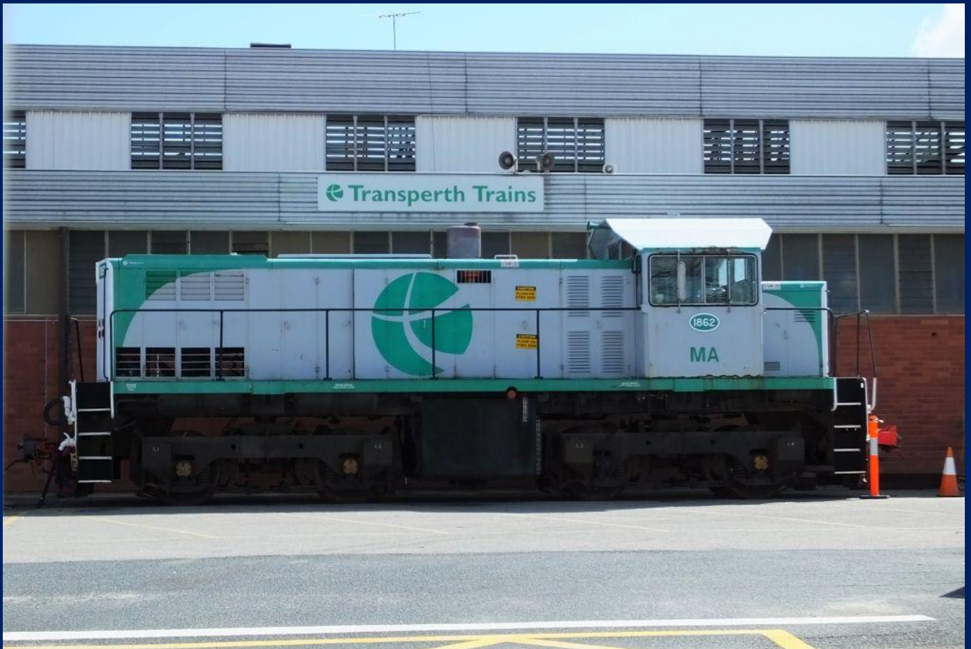
Former PTA transfer locomotive stabled out of service at Claisebrook RDC September 1st.