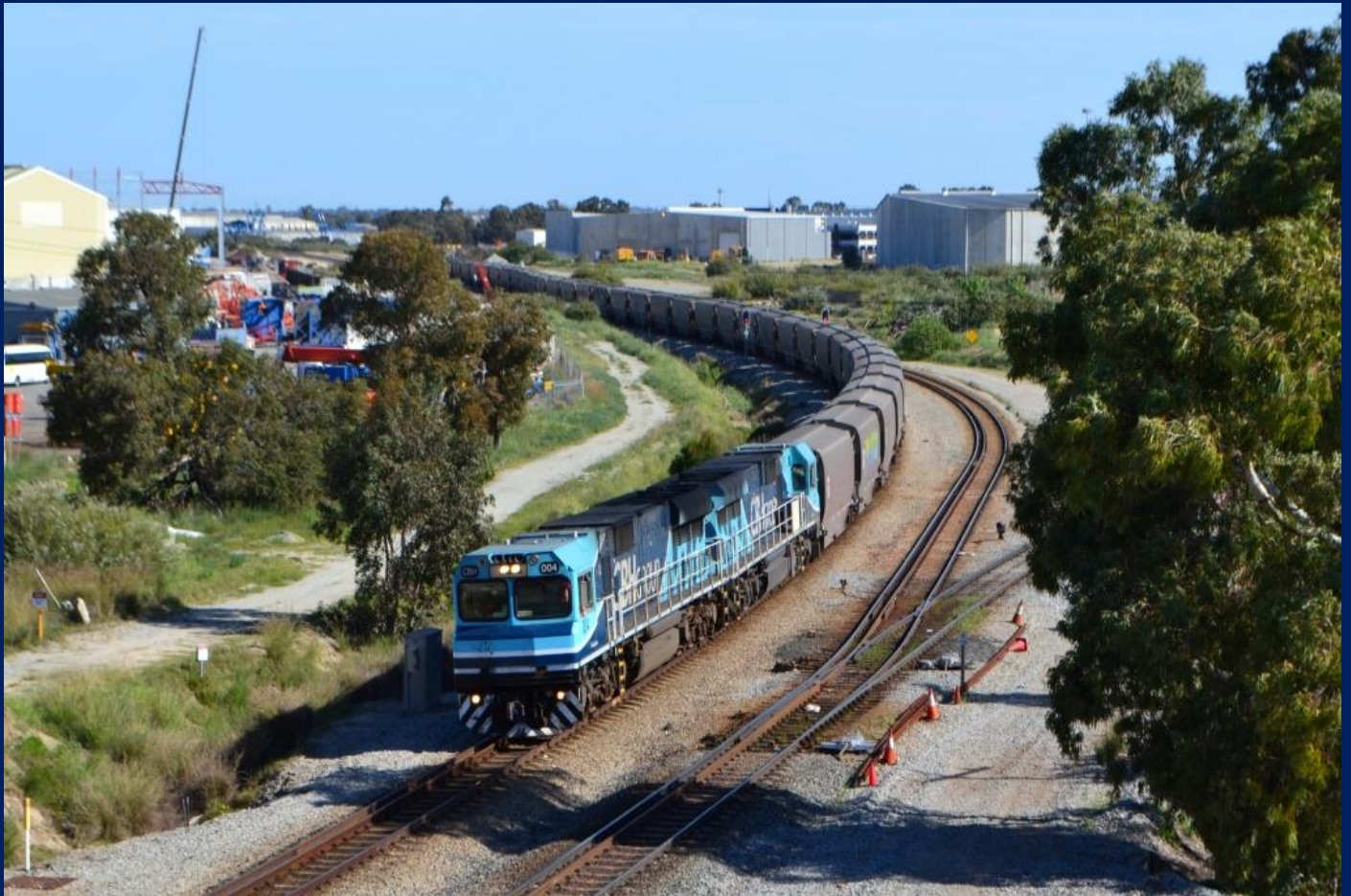
CBH004 & CBH012 on empty grain running thru on main line September 9th.