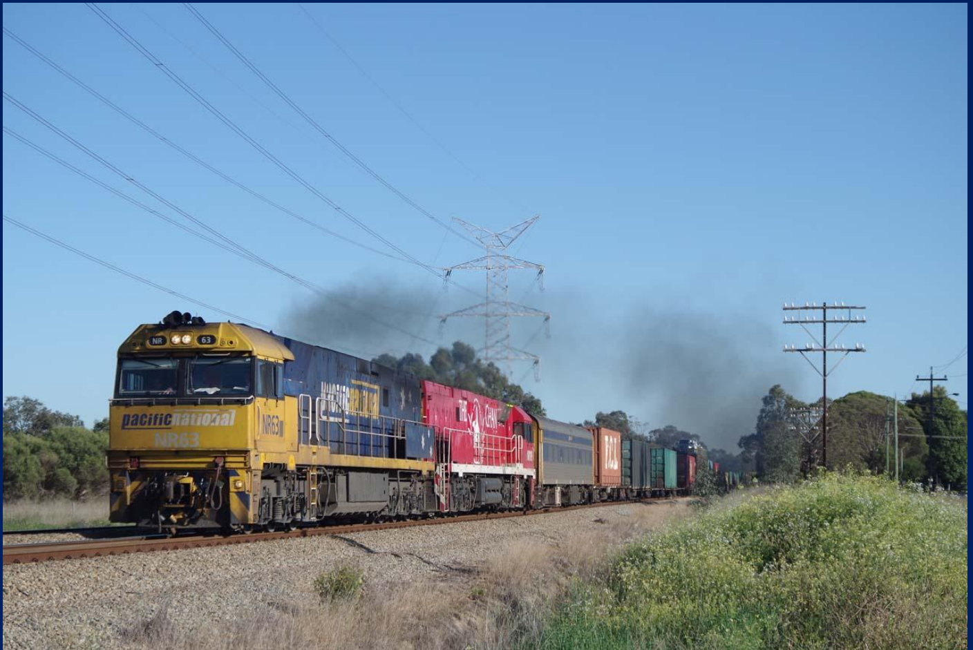
NR63 & NR109 on 1MP5 intermodal at Middle Swan September 4th.