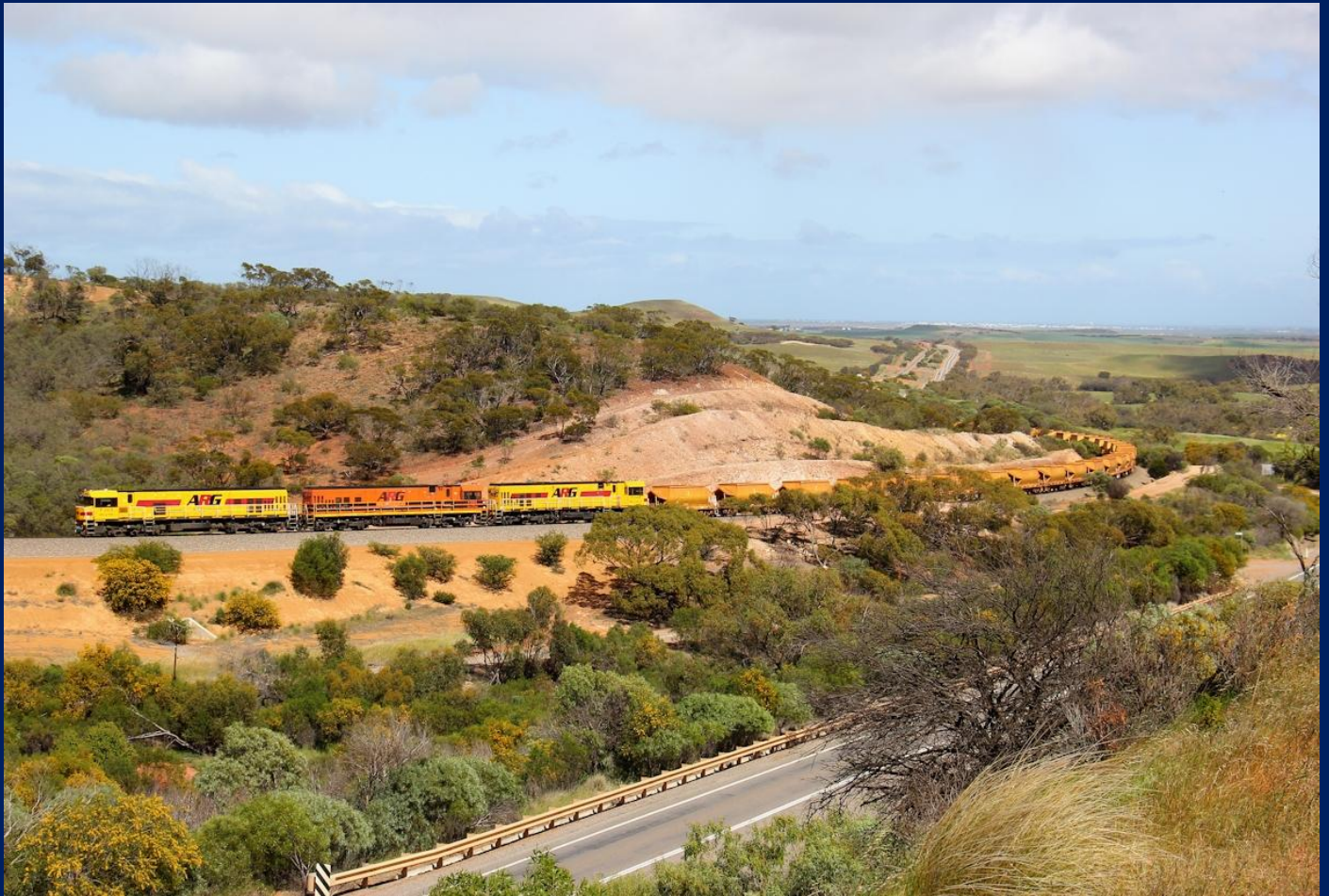
P2515, P2513 & P2508 on 1720 empty Mt Gibson iron ore climbing thru Bringo 13/9.