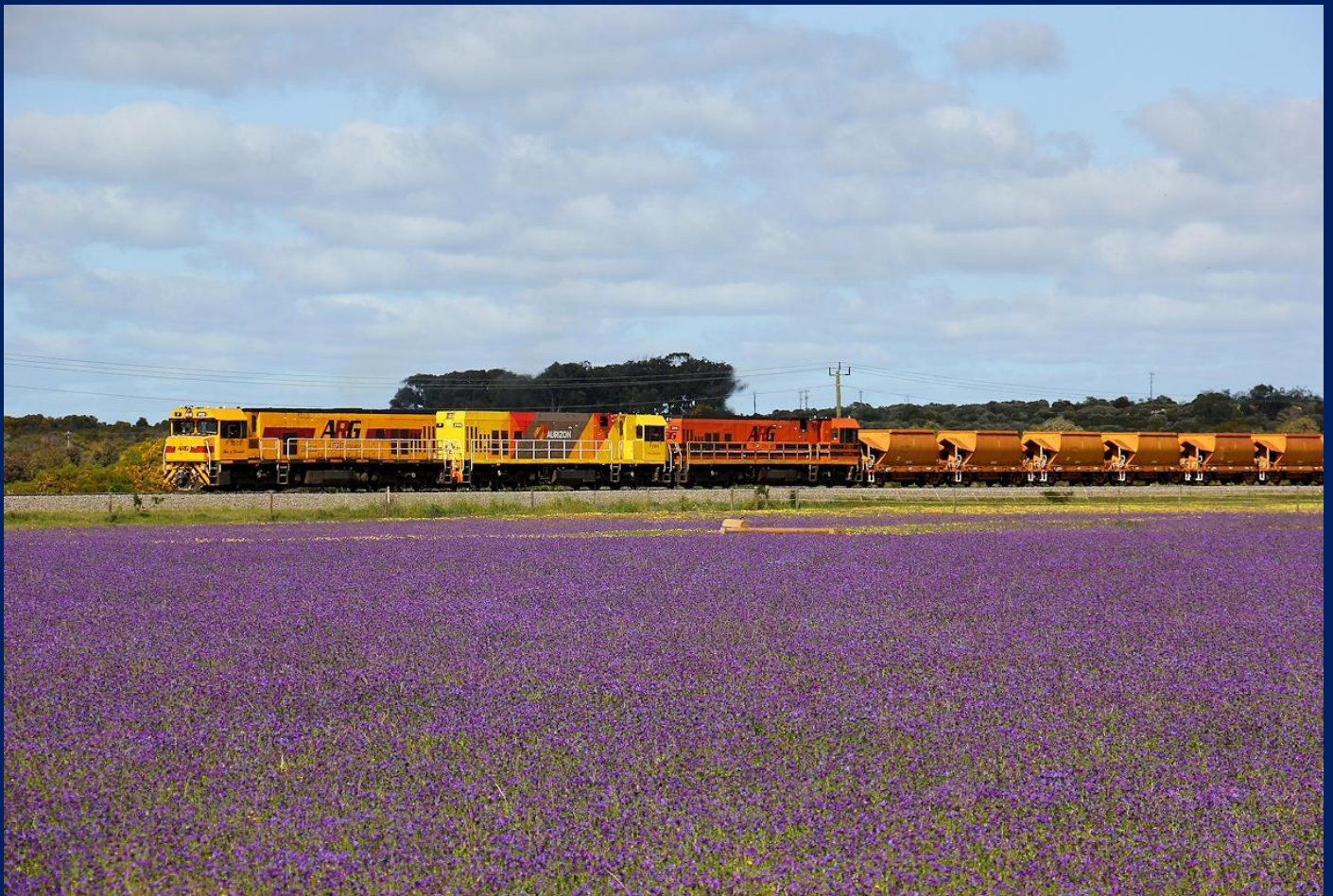
P2508, P2505 & P2513 on 3720 empty Mt Gibson ore East Narngulu September 1st.