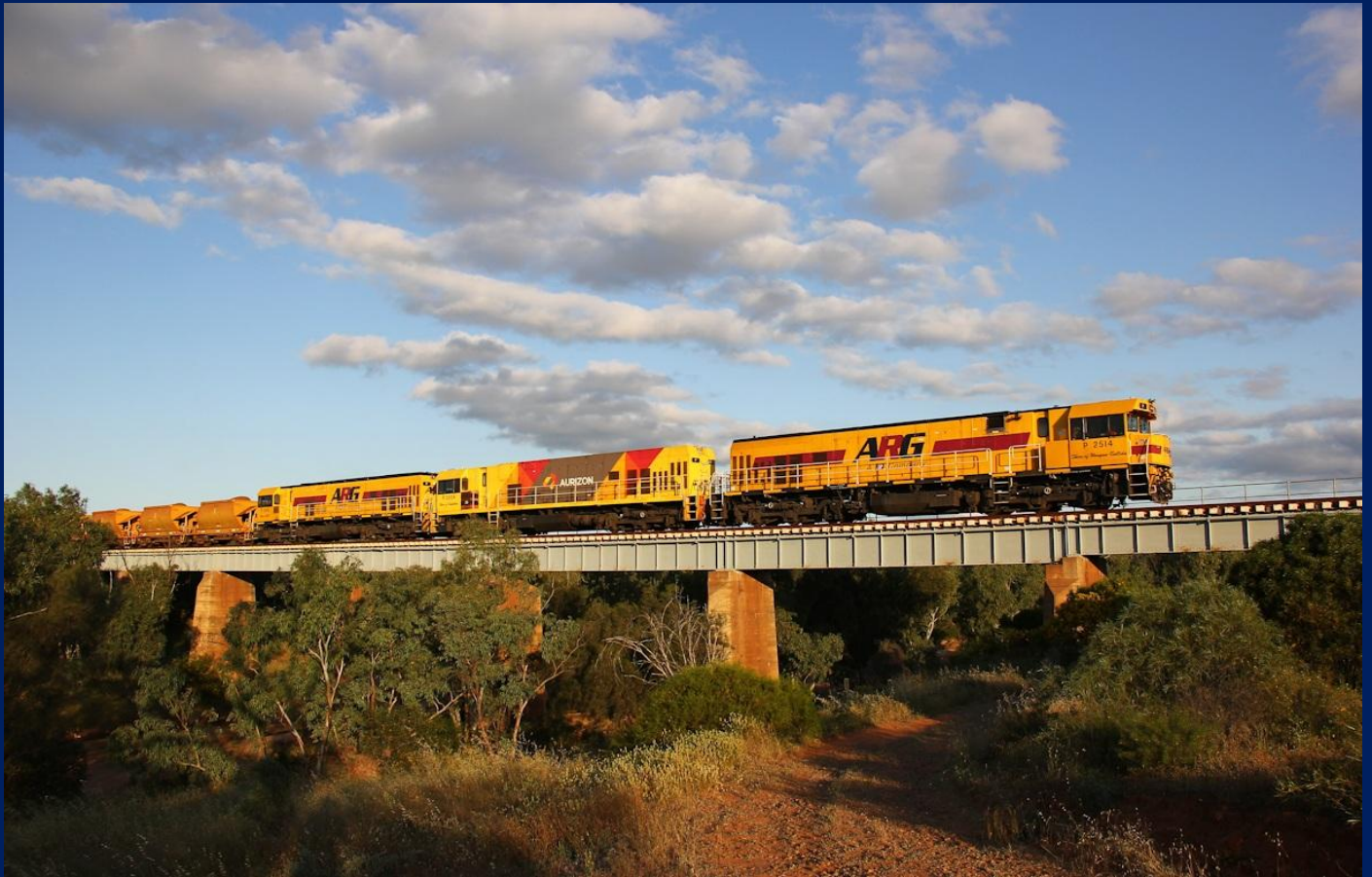
P2515, P2504 & P2514 on 7725 ore crossing Greenough River at Eradu September 19th.