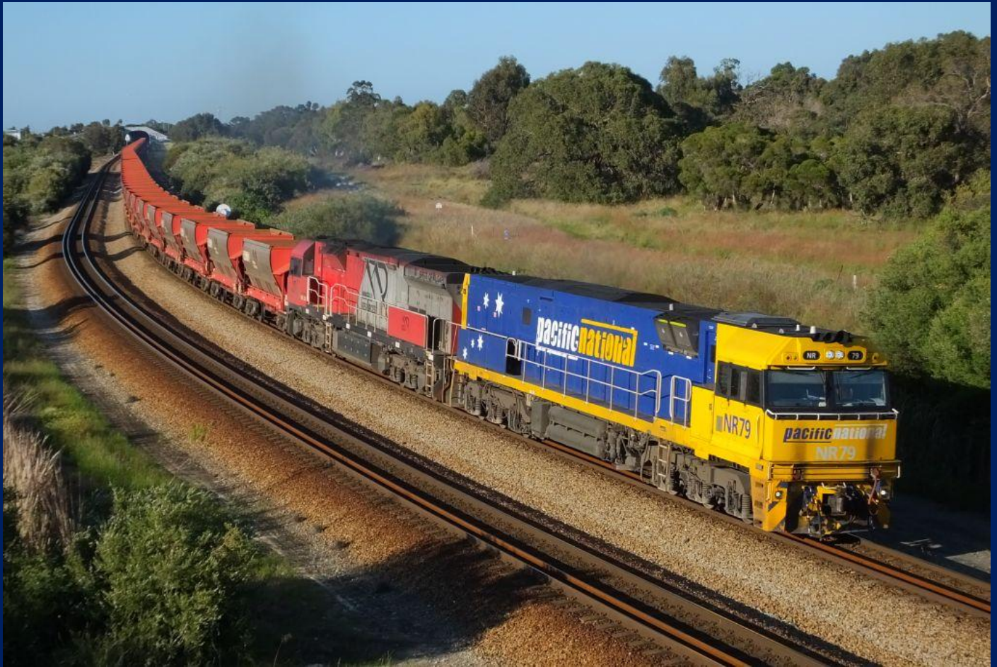
NR79 & MRL002 on 1033 empty Polaris ore to Mt Walton at South Guildford 20/9.