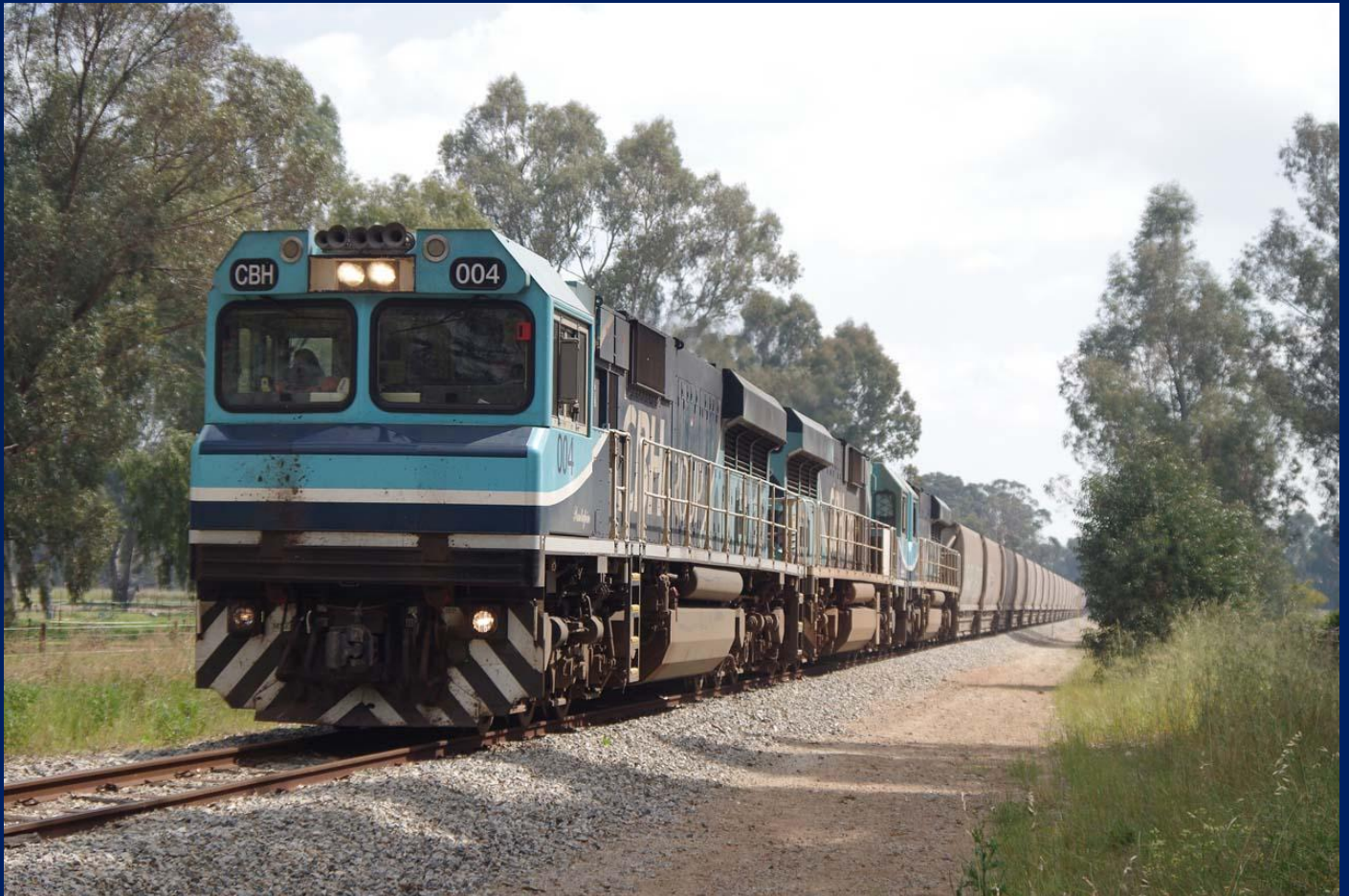
CBH004, CBH011 & CBH011 on 7K54 Watco grain at Millendon September 26th.