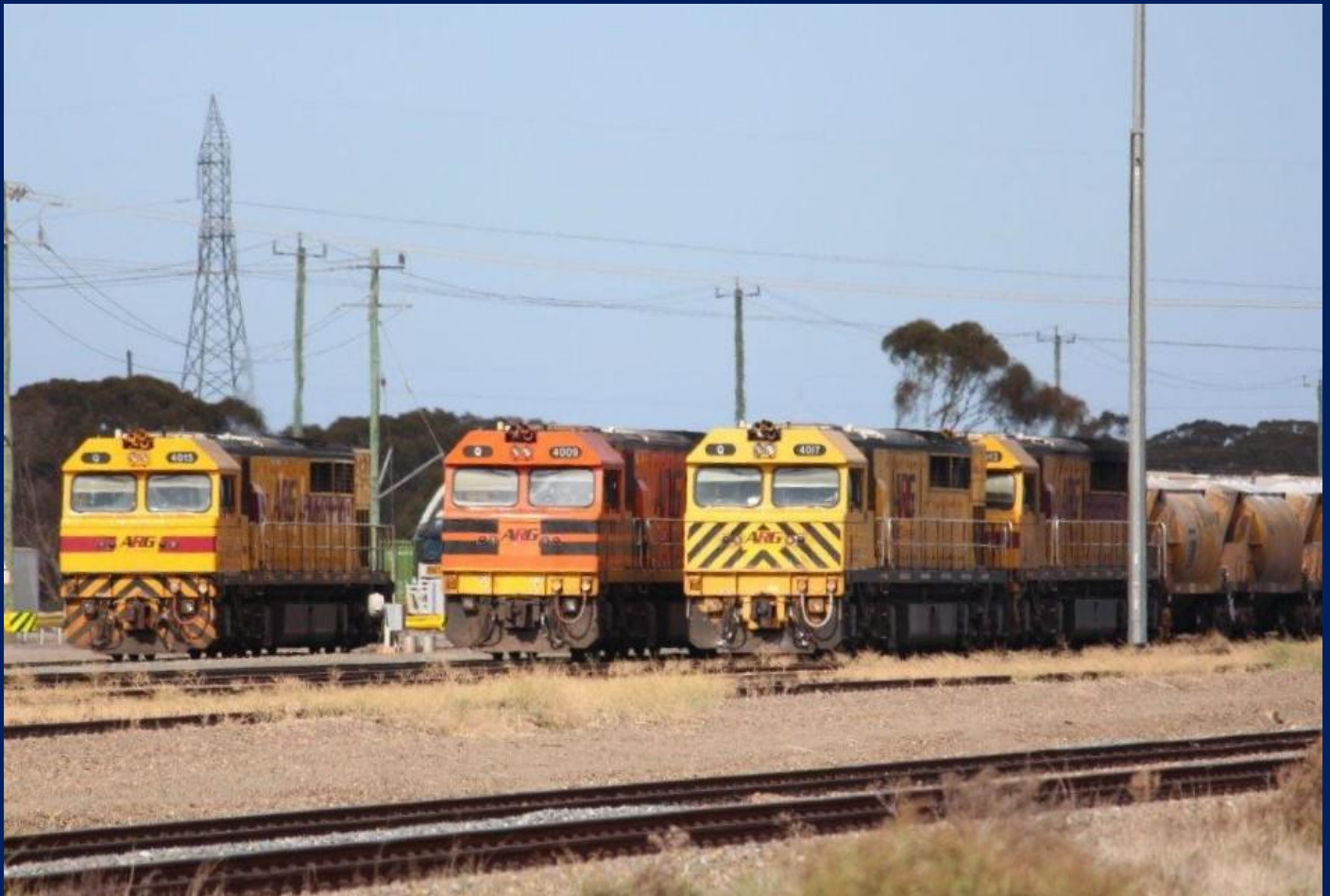
Q4015, Q4009, Q 4017 & Q4013 on 7C71 Parkeston shunter West Kalgoorlie 26/9.