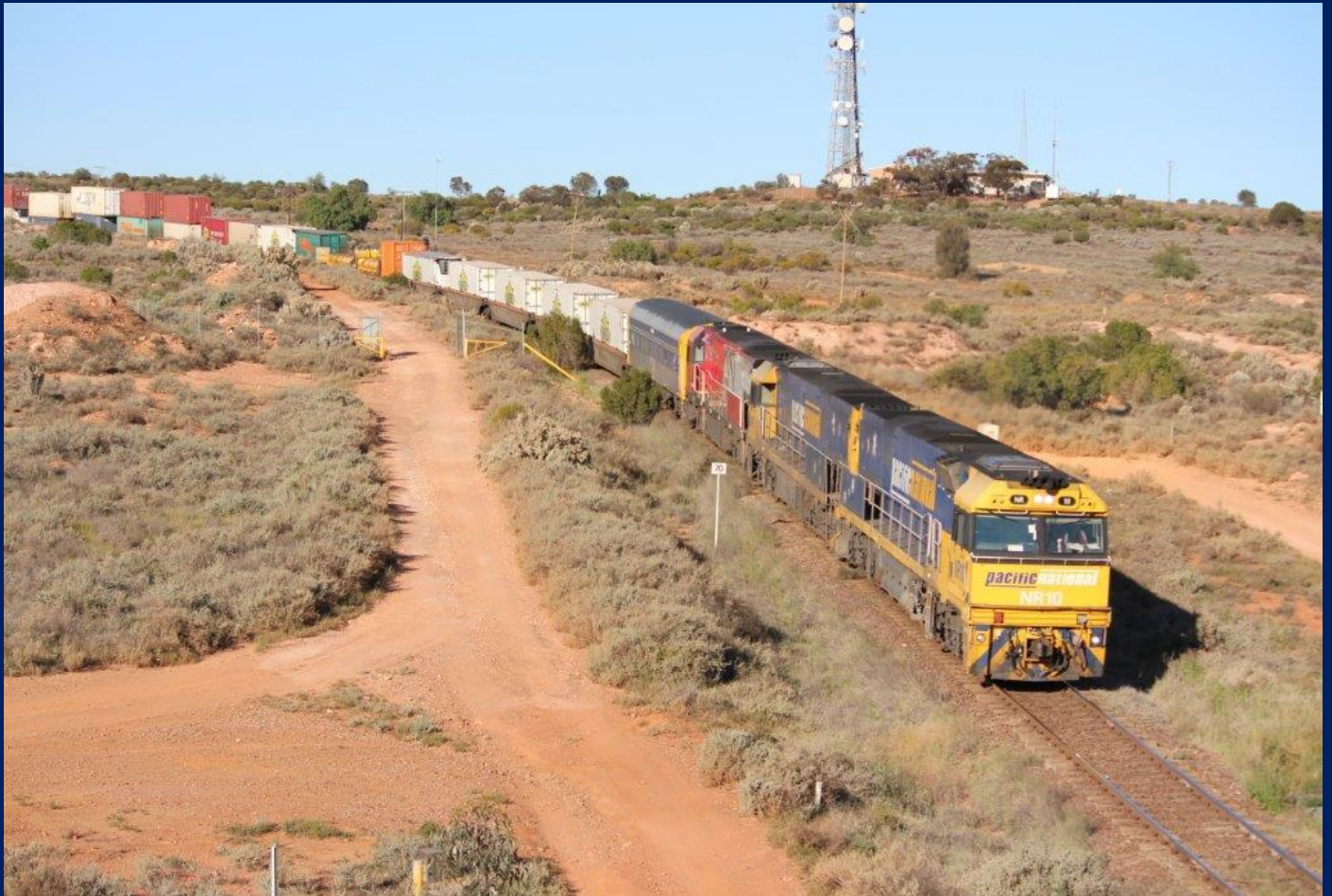
NR10, NR98 & MRL003 on 2MP5 intermodal entering Kalgoorlie September 23rd.