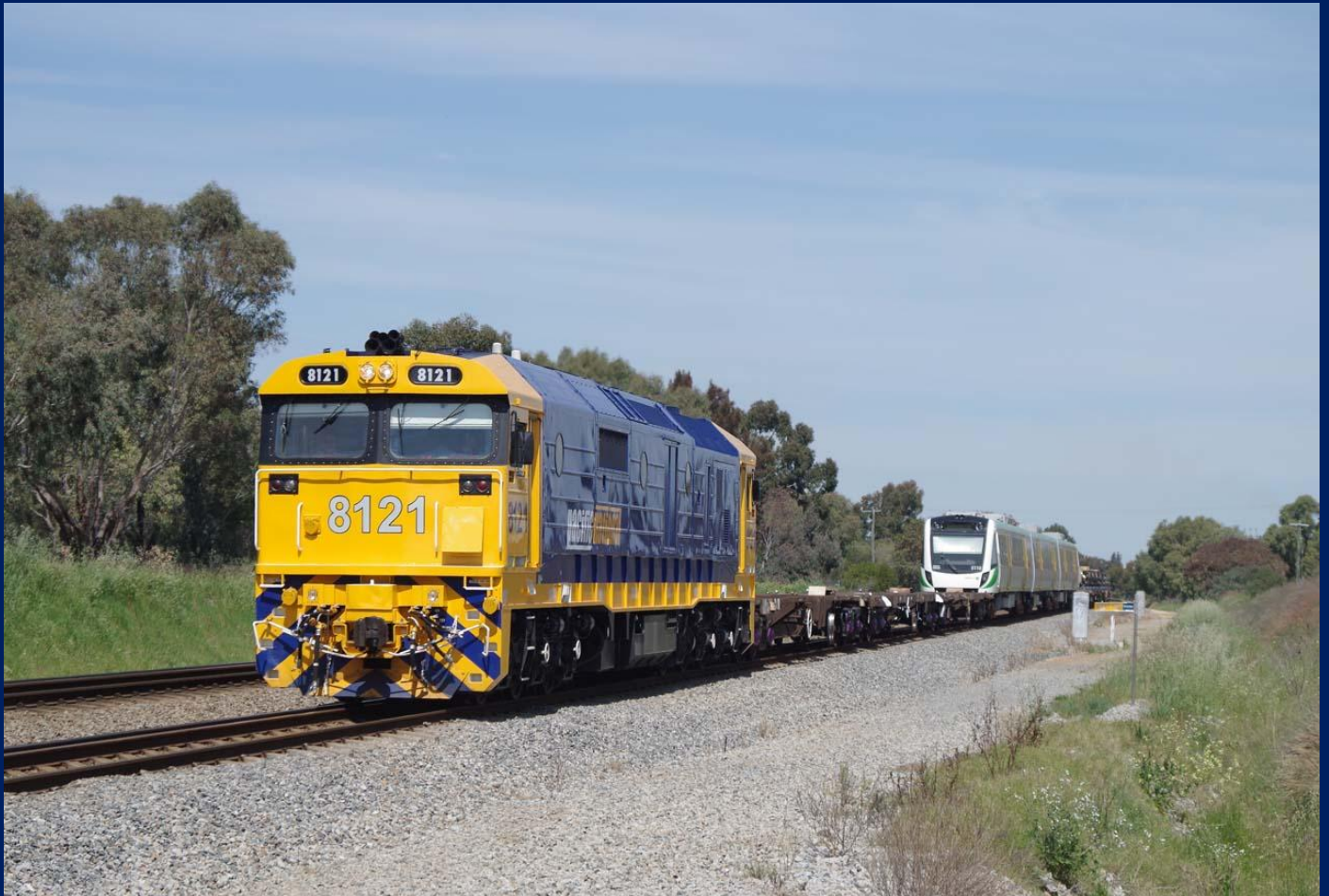
8121 on 6P31 hauling B series EMU set 110 approaching Woodbridge Junction 18/9.