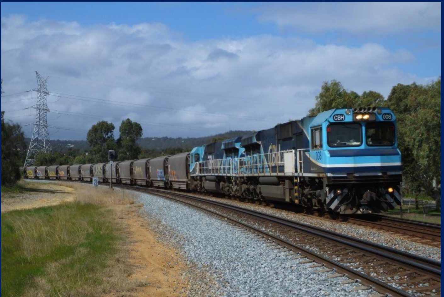
CBH008 & CBH007 on 7K24 Watco grain at Bellevue September 5th.