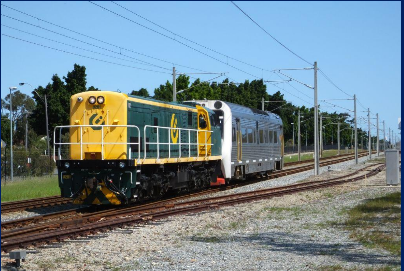
U201 on 9991 hauling Australind car ADP101 past Bassendean siding September 21st.