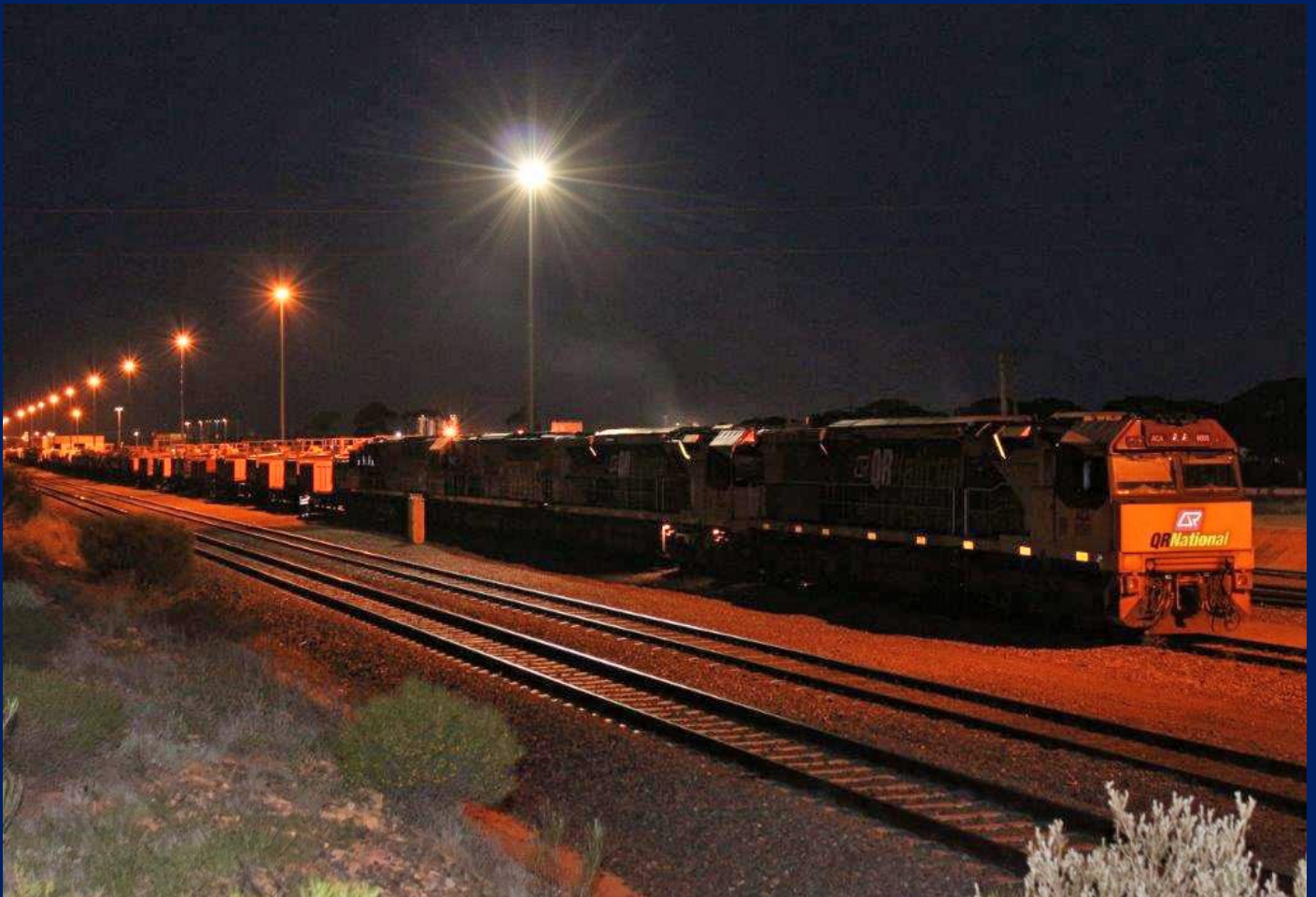
ACA6005, ACA6002, dead attached Q4003 & Q4009 on 2426 freight WEK yard 21/9.