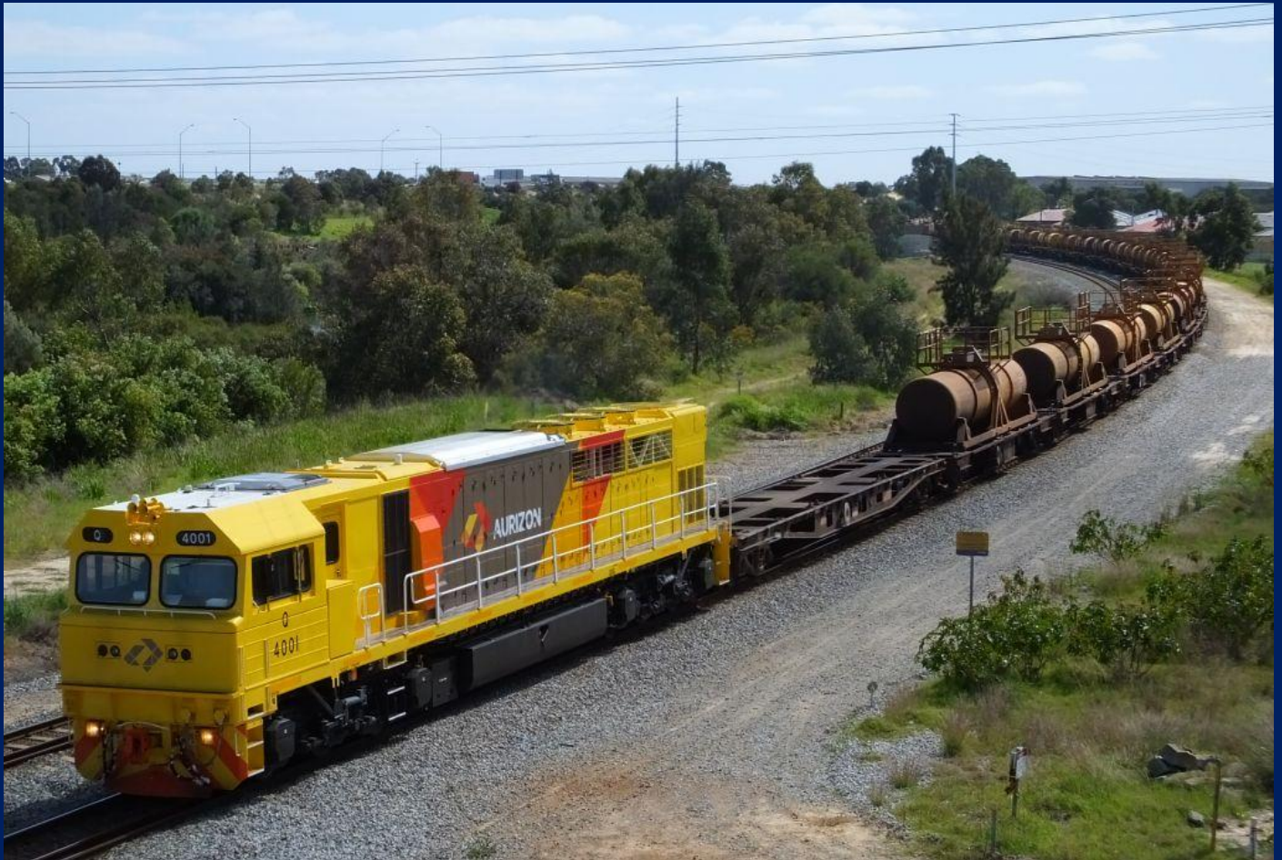
Q4001 on 2426 Kwinana shunter at Wattle Grove September 15th.