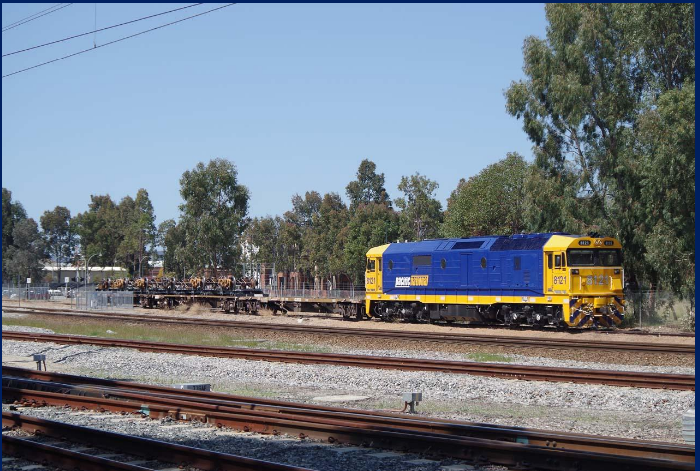
8121 on 6P32 standard gauge transfer bogies ex EMU set to Kewdale at Midland 25/9.