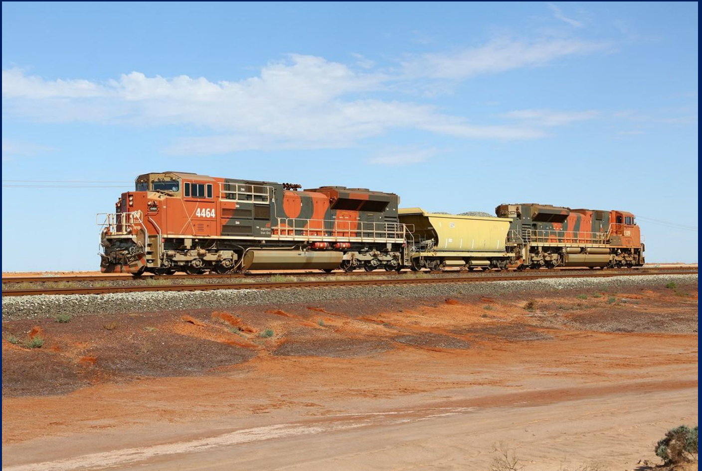
SD70ACe 4464 on un-braked ballast car & 4389 Flashbutt to Hedland yard 22/9.