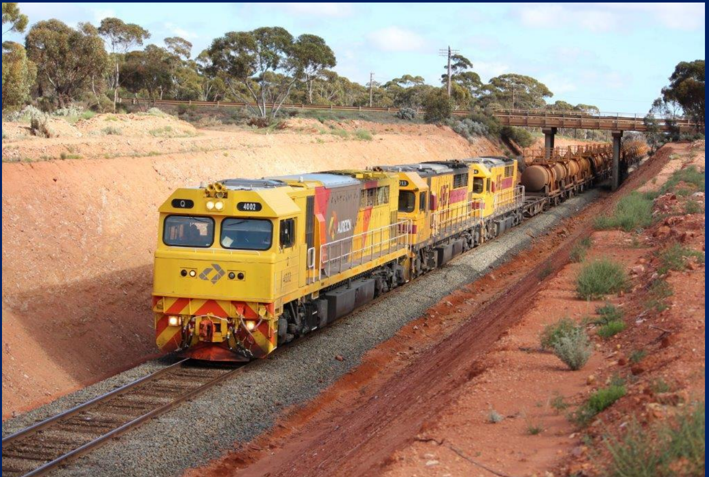
Q4002, Q4013 & Q4014 on 1405 empty acid rake West Kalgoorlie to Hampton 20/9.