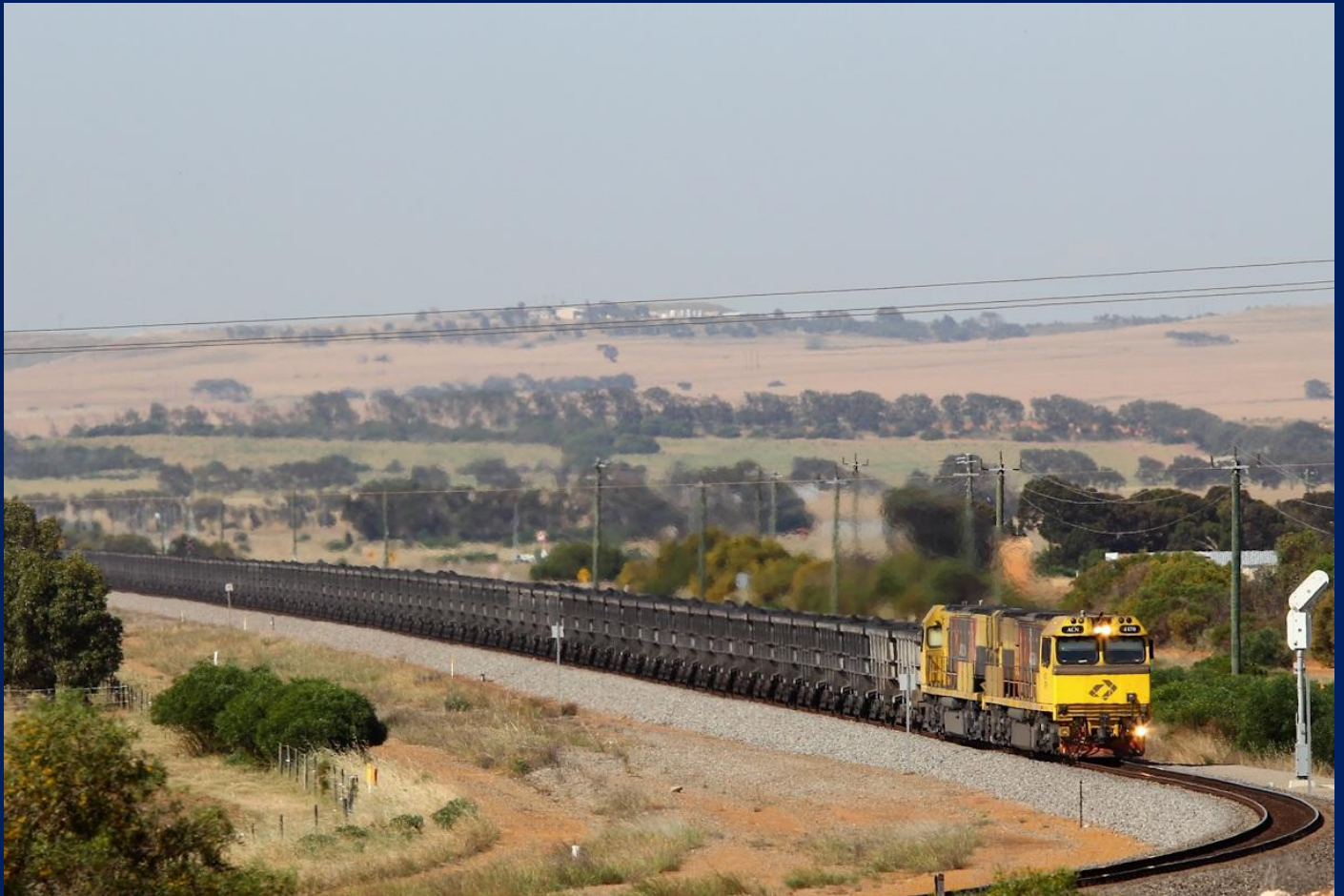
ACN4170 & ACN4171 on 2763 loaded Karara ore into Narngulu September 28th.