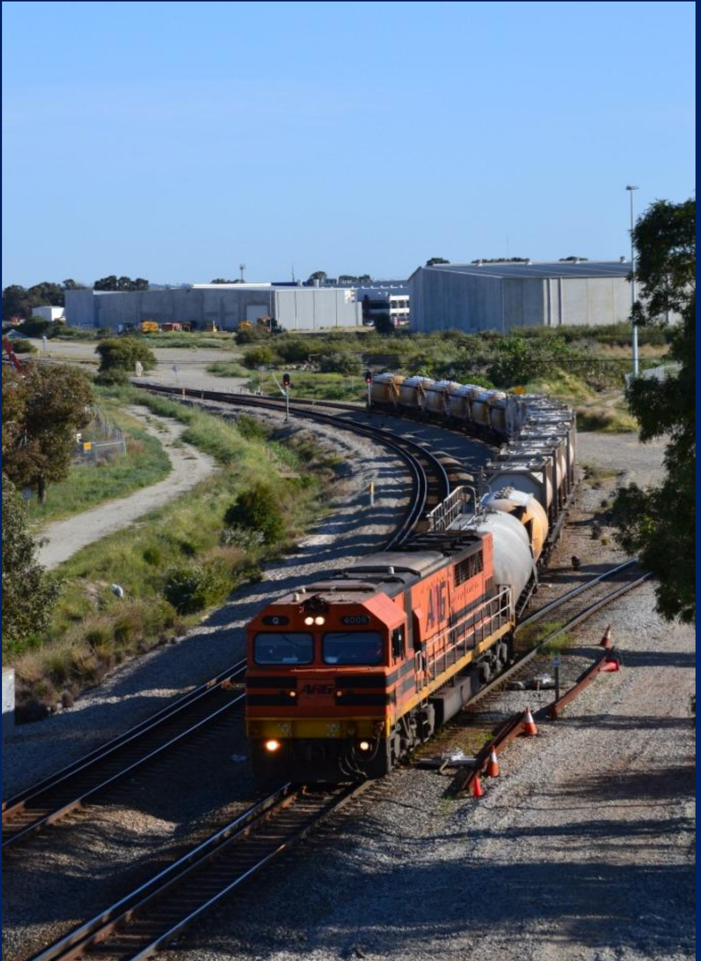
Q4009 on 4197 Soundcem shunter about to enter Forreestfield Yards September 9th.