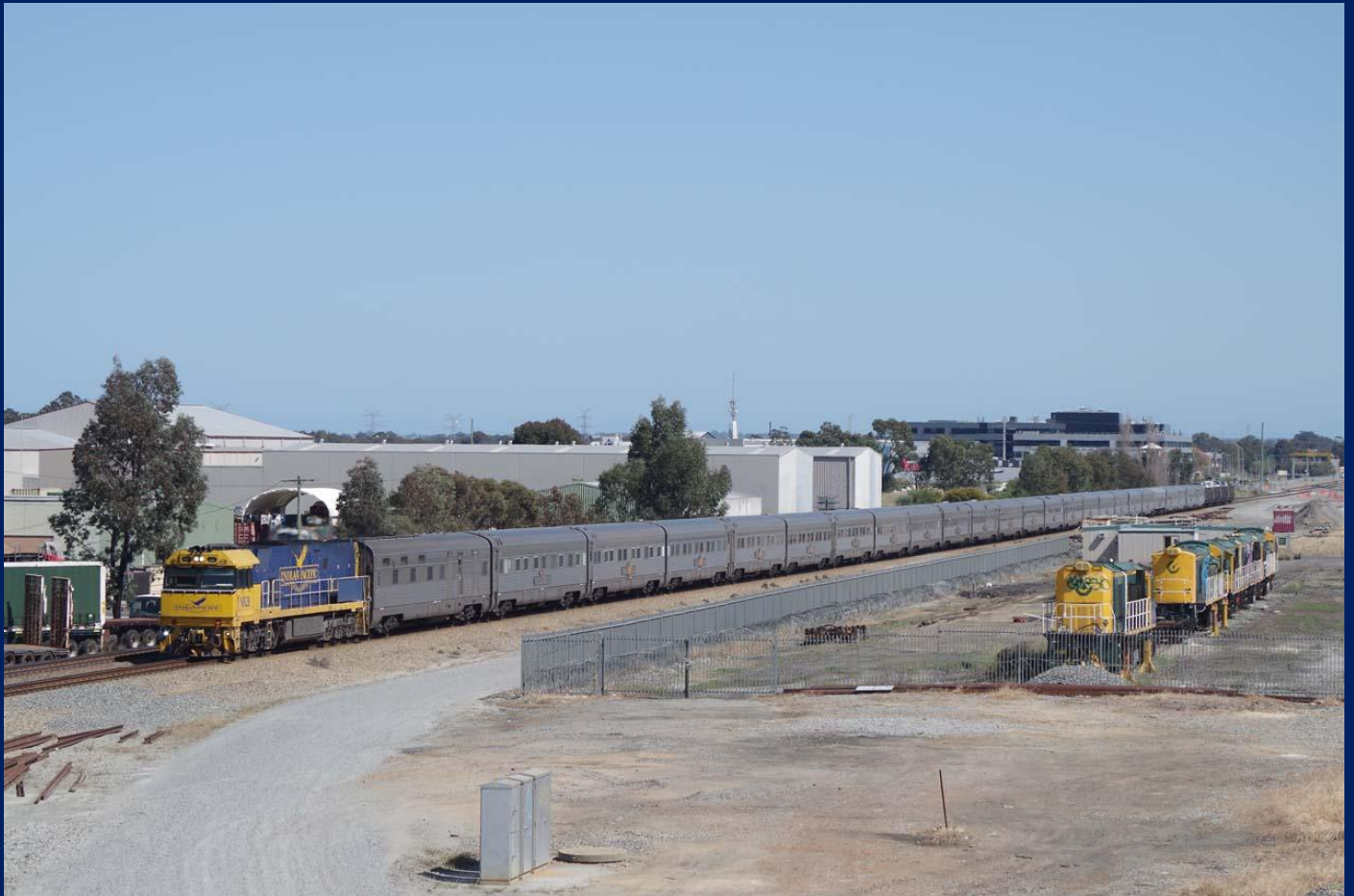
NR28 on 1PA8 Indian Pacific passing old Gemco compound Bellevue September 20th.