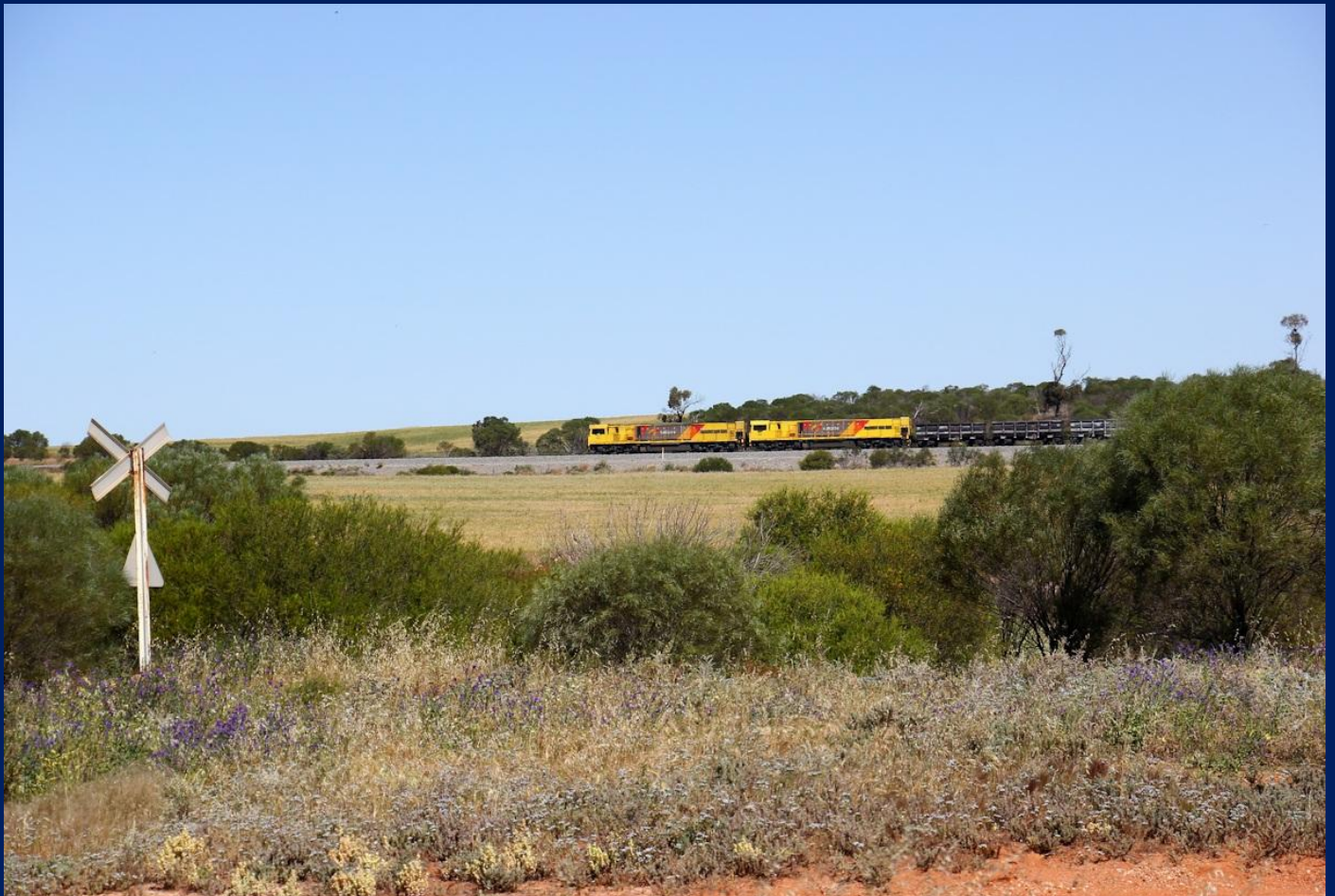
ACN4141 & ACN4152 on 1762 empty Karara ore heading to Tilley Junction and mine with disused Mullewa Pindar line level crossing in the foreground at Mullewa September 20th.