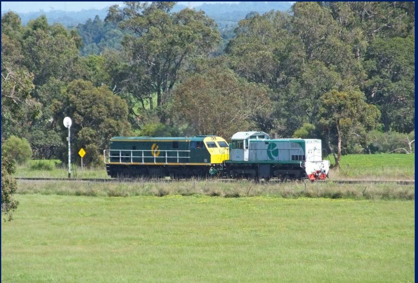
U201 hauls MA1862 on 4PL3 light engine at Keysbrook September 9th.