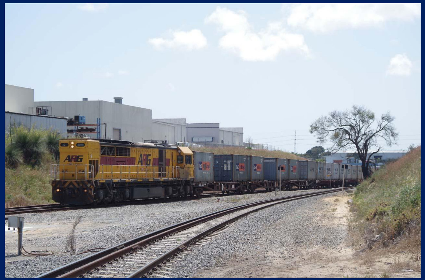
Q4019 on 4195 container train Forrestfield to North Port at Cockburn Junction 30/9.