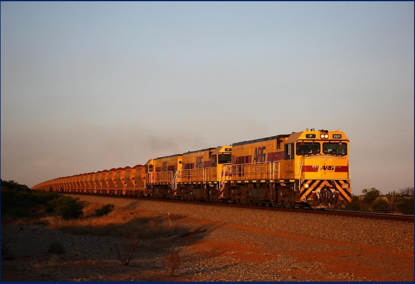
P2501, P2514 & P2502 on 2725 loaded iron ore at sunset at Kojarena October 26th.