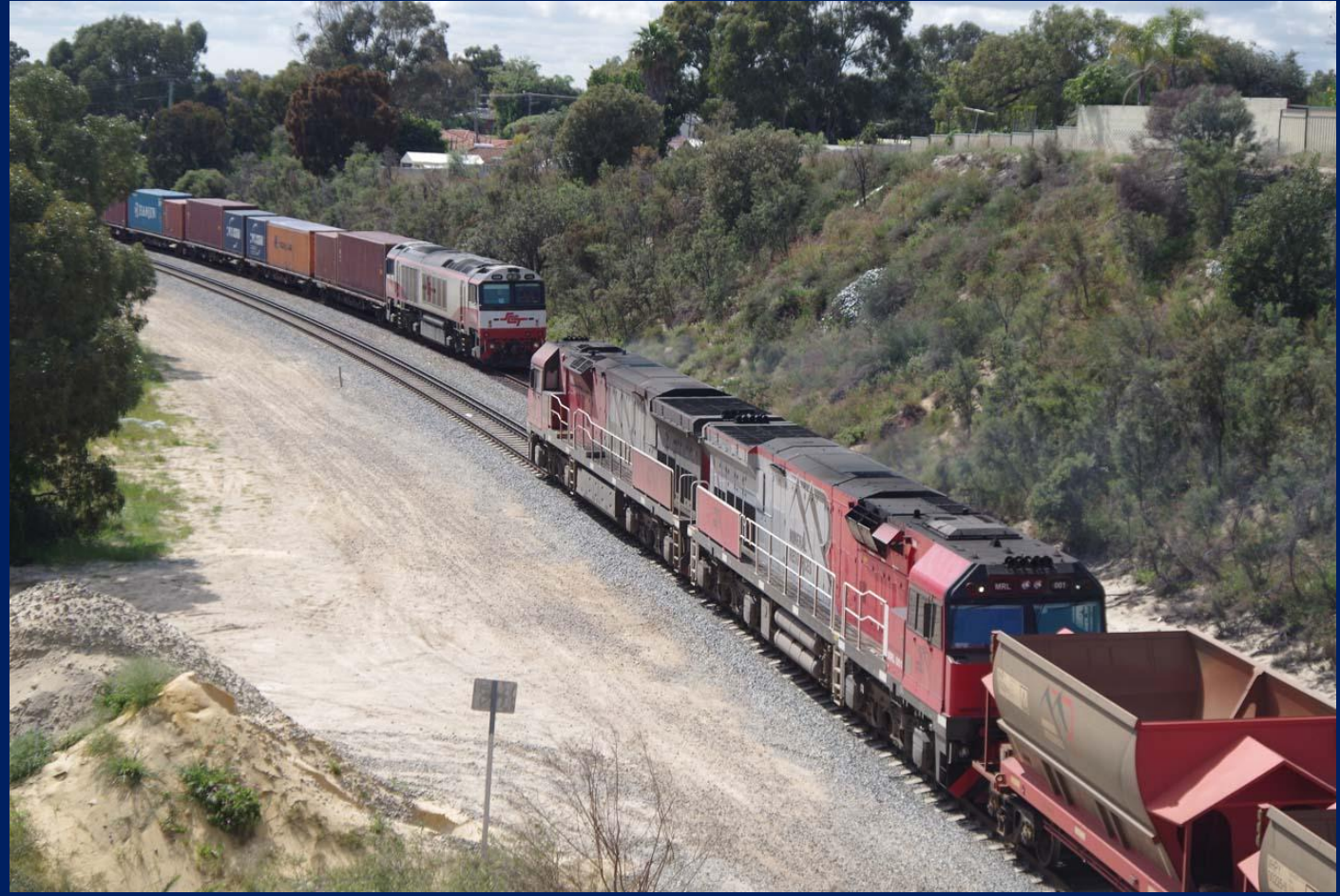
MRL004 & MRL001 on 4033 empty Polaris ore crosses CSR006 on 4142 intermodal Cockburn Junction 30/9