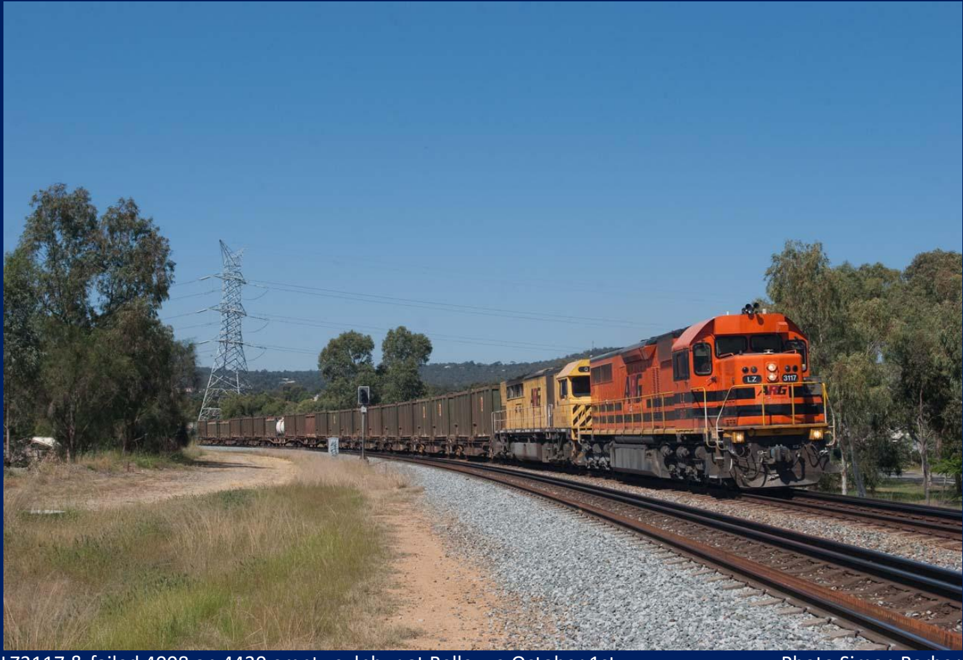
LZ3117 & failed 4008 on 4430 empty sulphur at Bellevue October 1st.