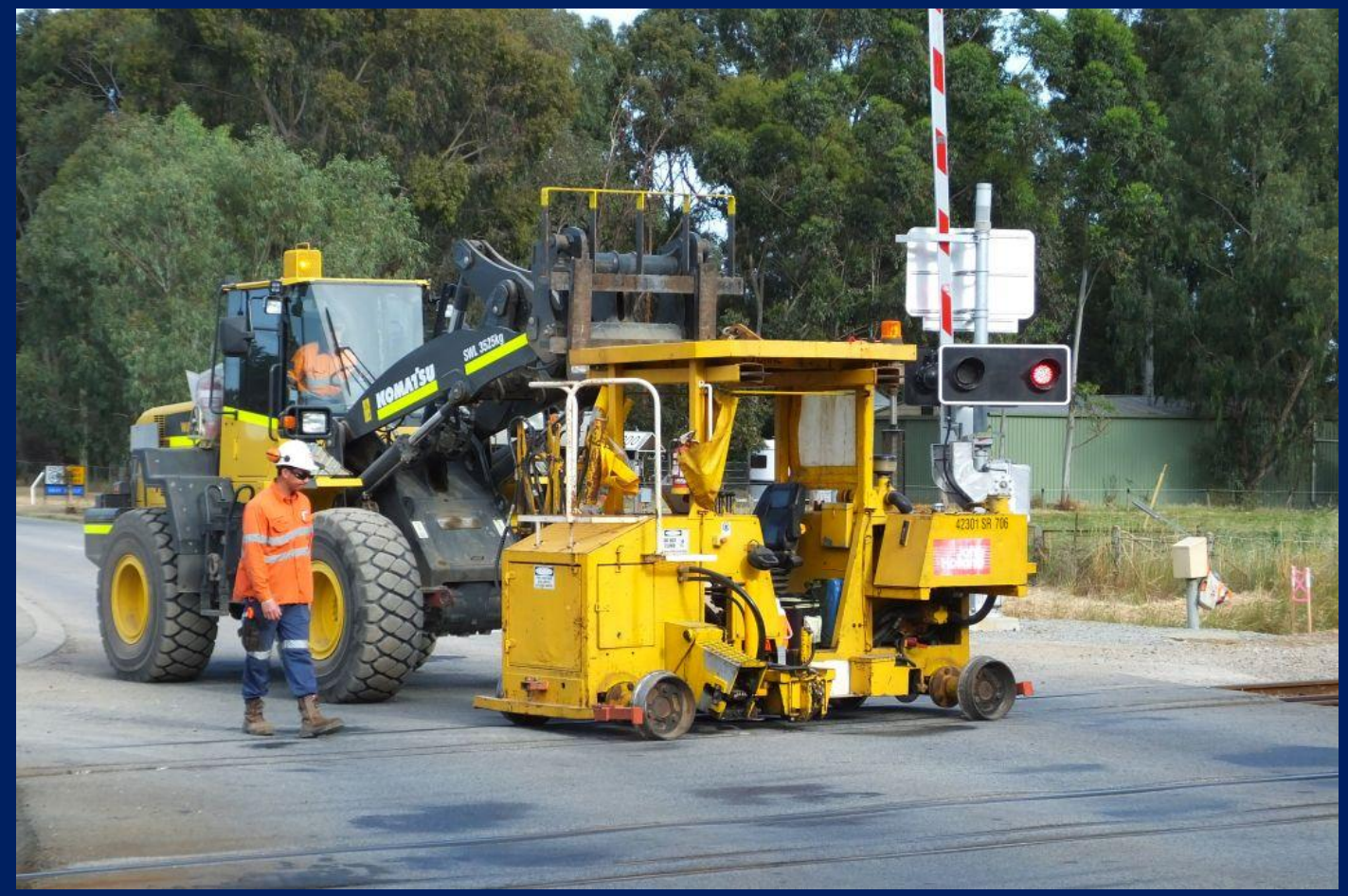
Sleeper replacer track machine being lowered onto track at Bushmead Road Woodbridge October 18th.