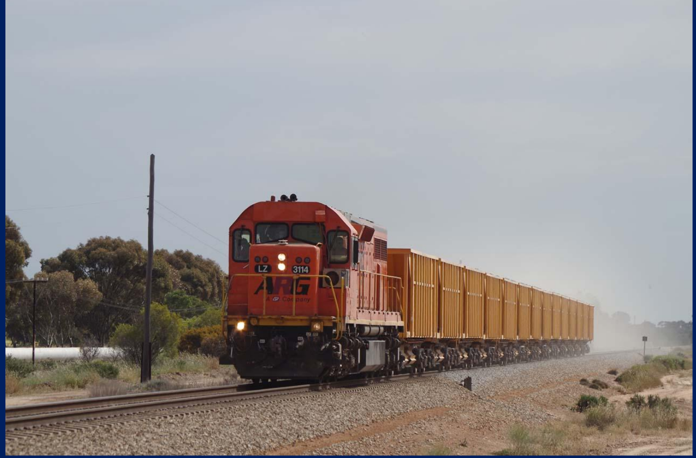
LZ3114 on 6BTI ballast train at Cunderdin October 2nd.