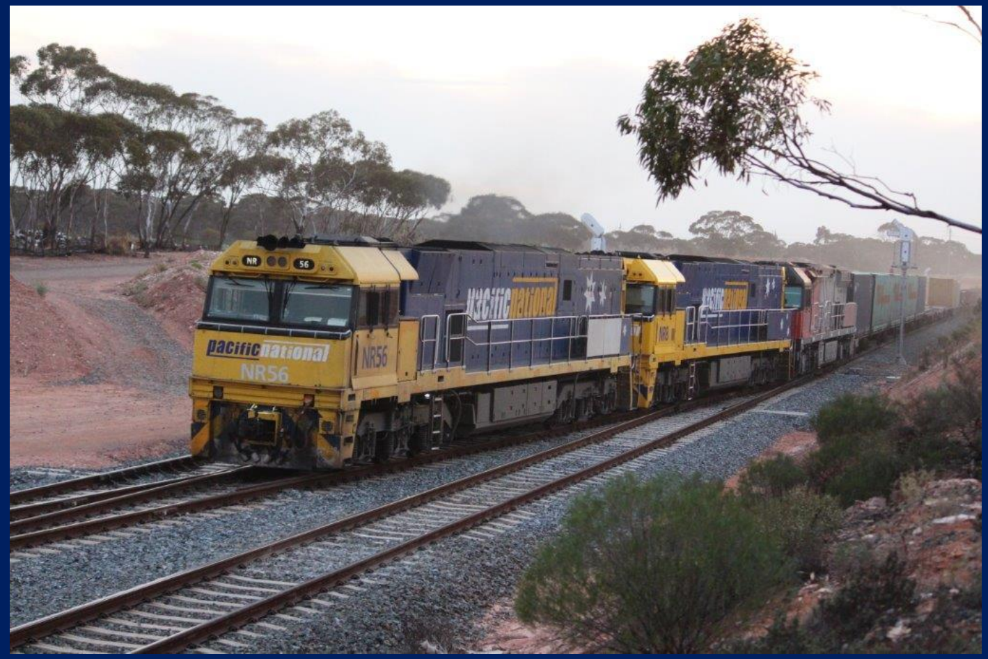
NR56, NR8 & MRL006 on 7PX4 crossing over to enter West Kalgoorlie Yard 3/10.