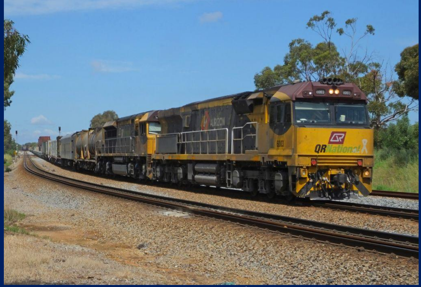
6003 & LDP006 on 7PM1 Aurizon intermodal at Woodbridge 3/10 it now departs earlier.