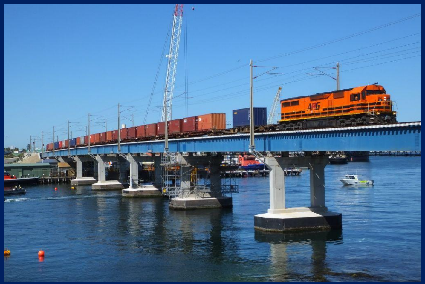
LZ3117 on 4196 container train Forrestfield to North Port crossing Swan River at Fremantle 21/10.