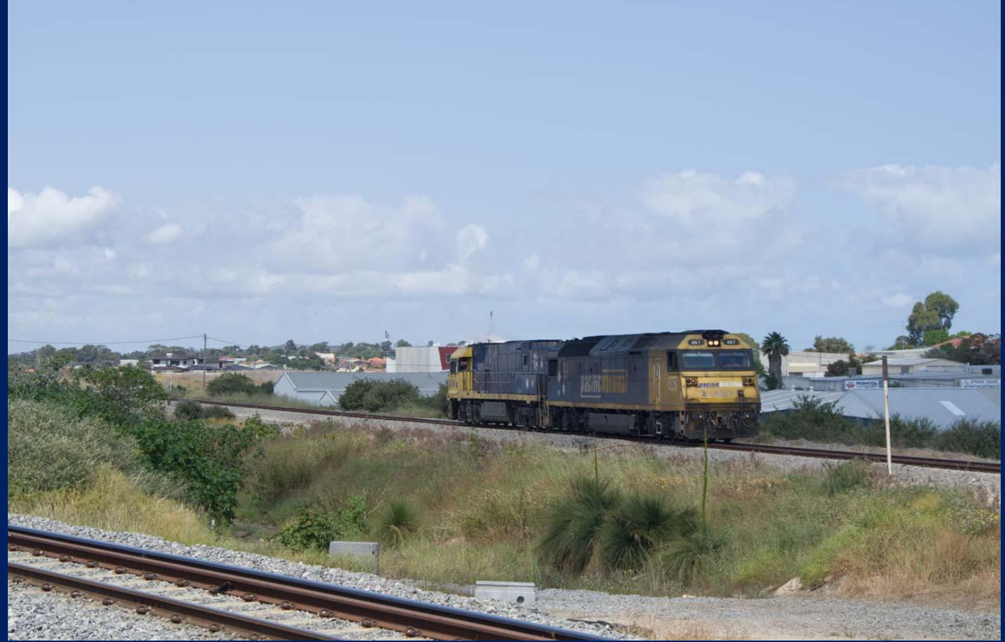
AN7 & NR21 on 4P22 locomotive turn at Cockburn Junction September 30th.