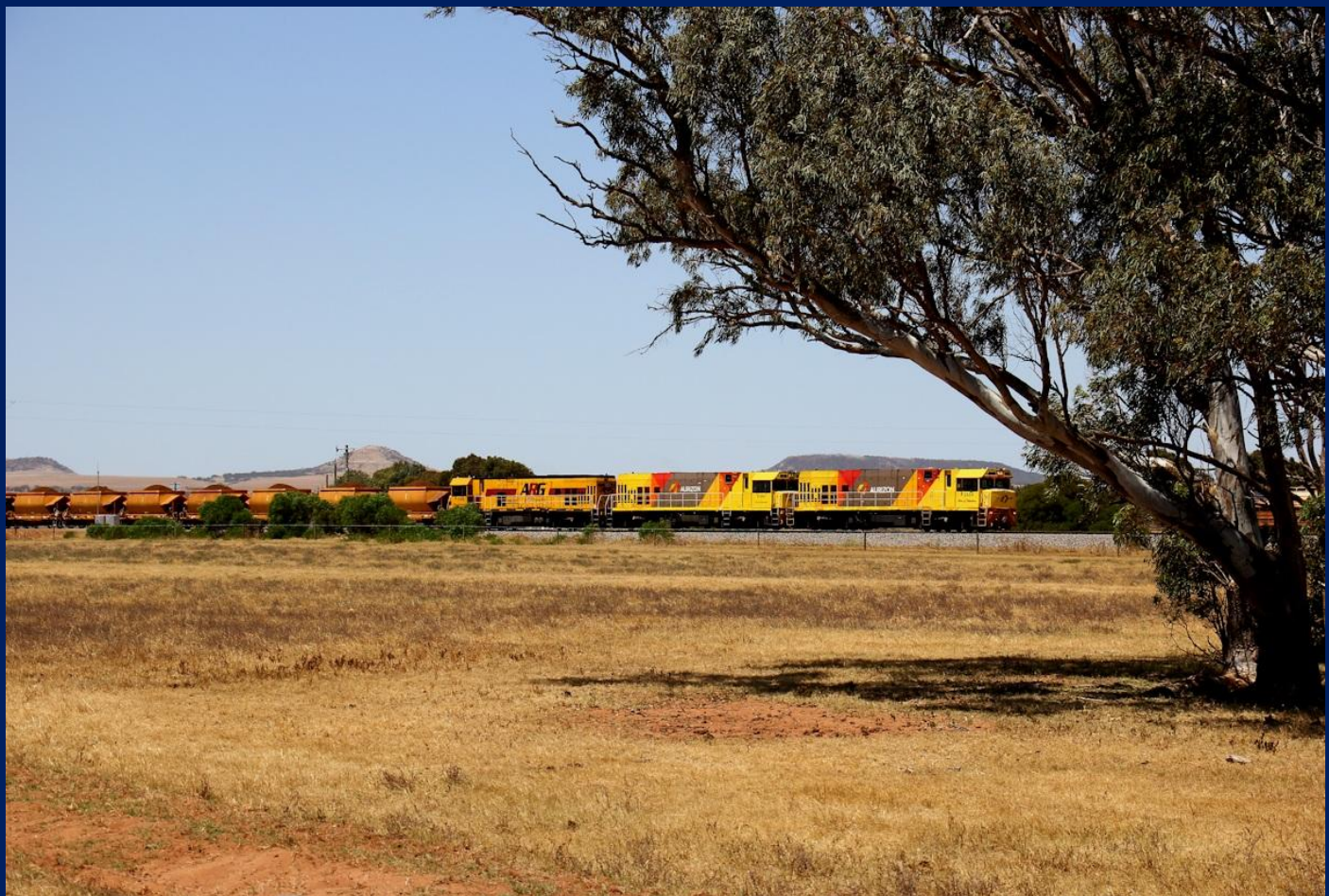
P2504, P2517 & P2508 on 2721 Mt Gibson iron ore passing Narngulu East October 21st.