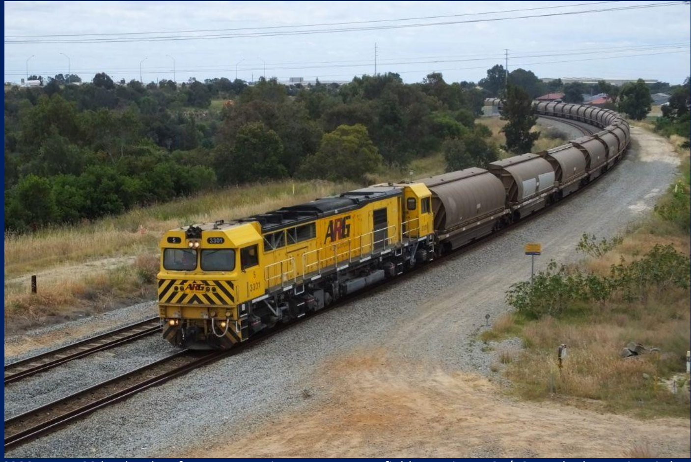
S3301 on 7122 hauls rake of empty XT grain wagons Forrestfield to Kwinana 24/10.