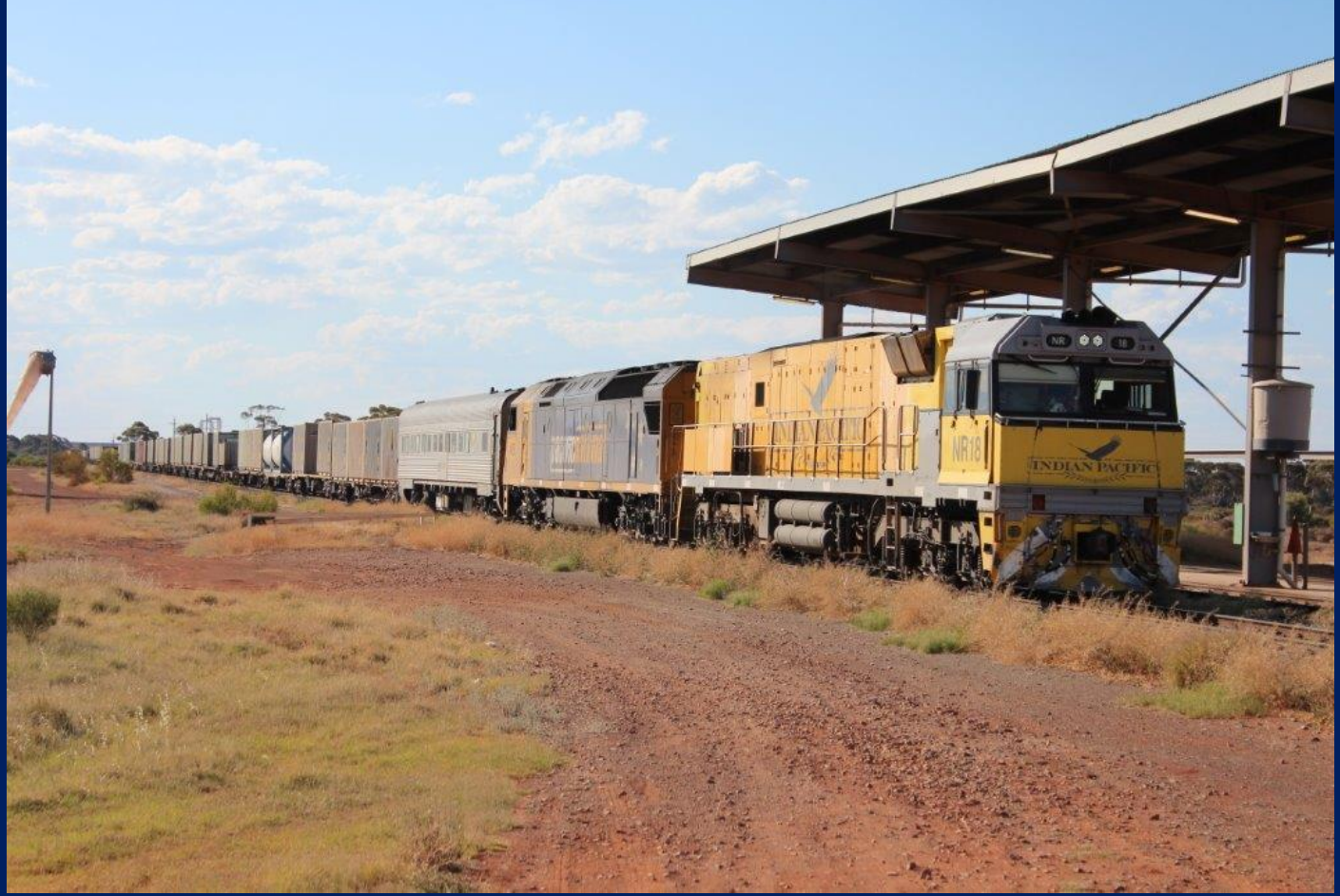
NR18 & AN5 on 4PM4 intermodal at eastern fuel point Parkeston October 22nd.