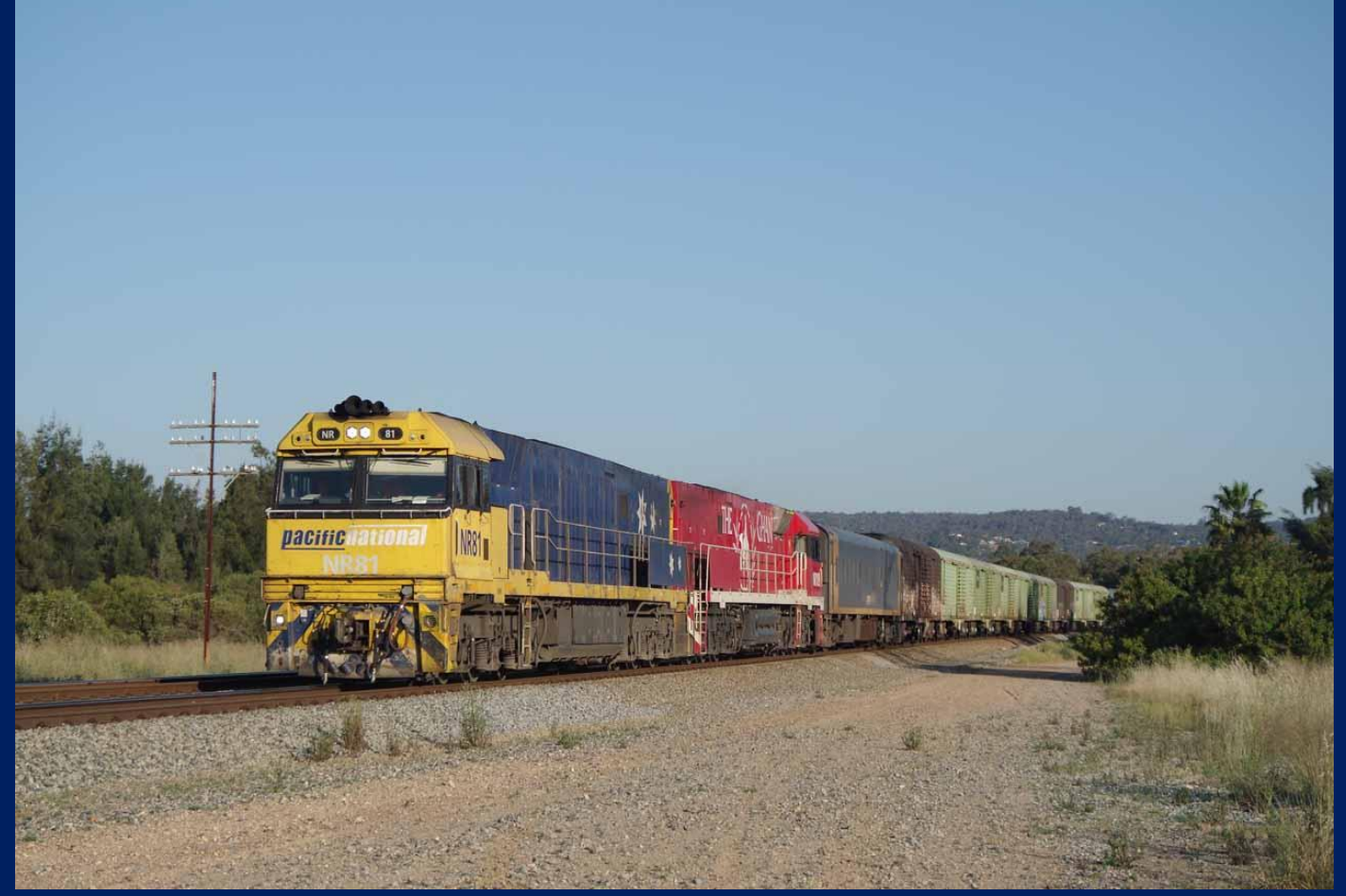
NR81 & NR109 on 2PM5 Perth Melbourne intermodal at Stratton October 12th.