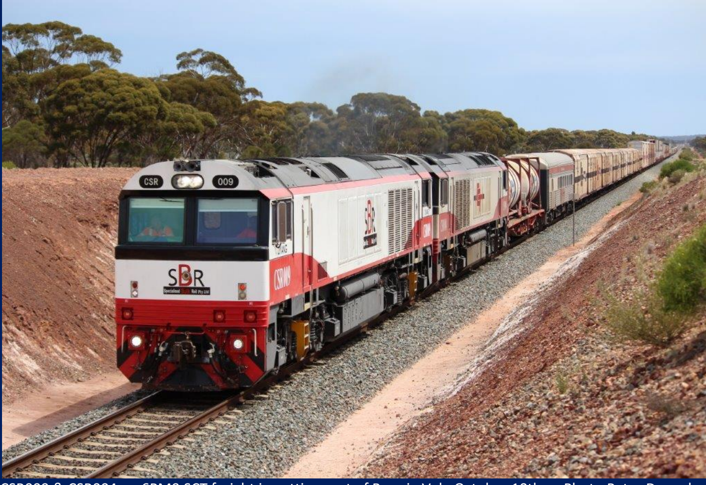
CSR009 & CSR004 on 6PM9 SCT freight in cutting east of Bonnie Vale October 10th.