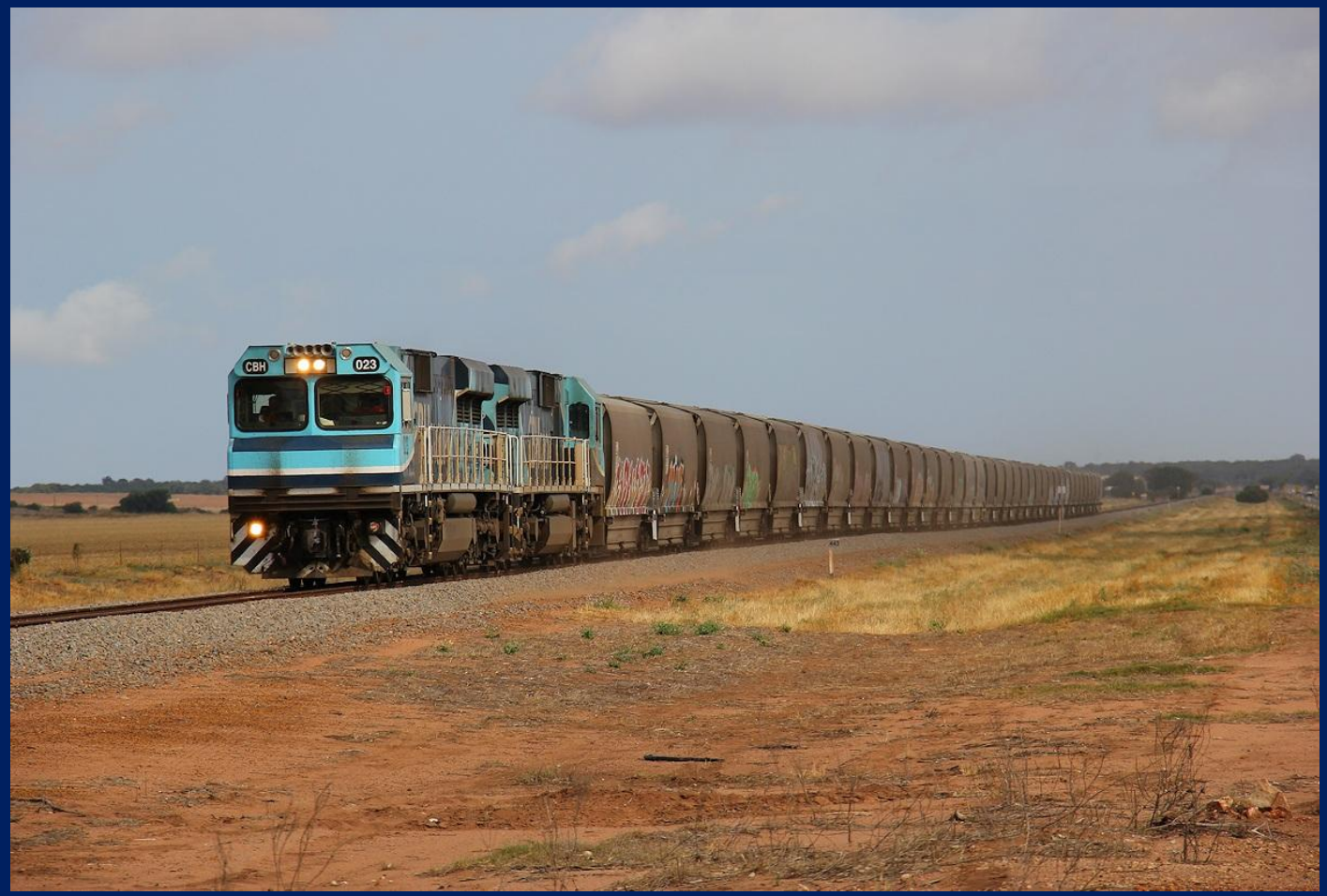
CBH023 & CBH024 on 7G50 empty grain to Mingenew at Georgina October 31st.