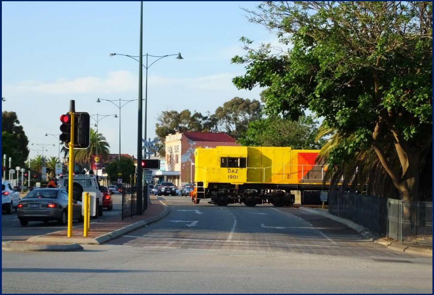
DAZ1901 crossing over Helena Street Midland October 9th.