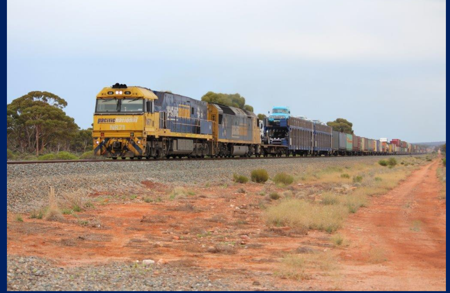
NR71 & AN7 on 6PM6 intermodal with new double deck car carriers at 631km 10/10.