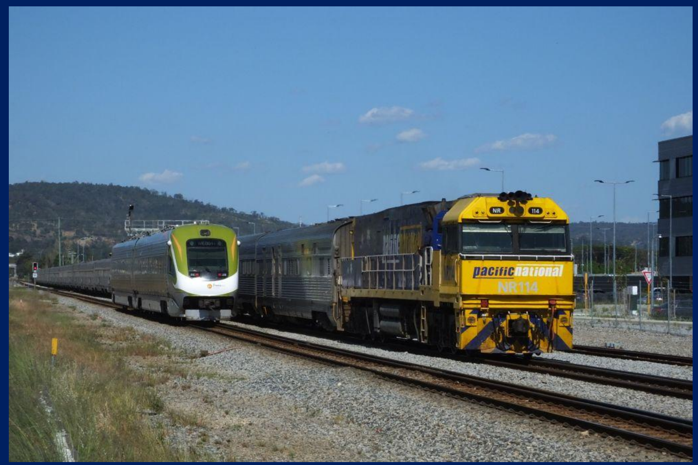
NR114 on 5AP8 Indian Pacific passing Avonlink cars to Flashbutt at Midland 17/10.