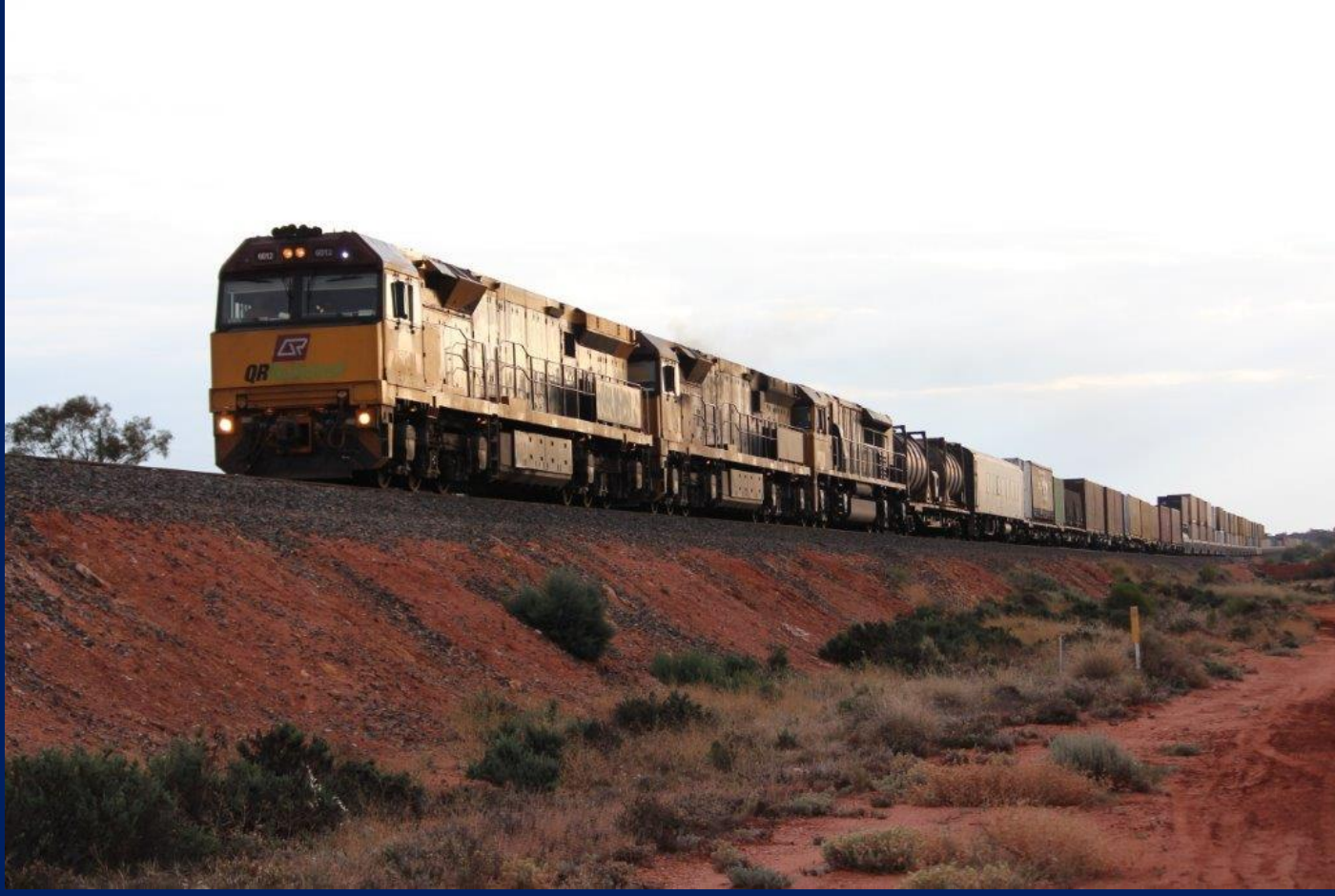
6012, 6003 & LDP006 on 7PM1 Aurizon intermodal at Binduli October 10th.