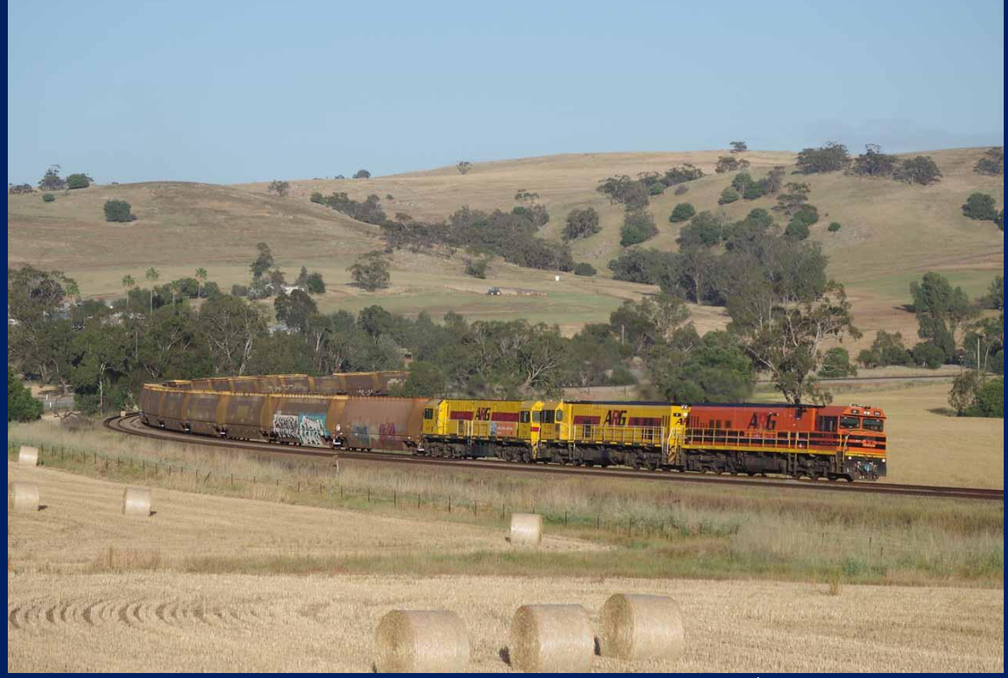
P2503, P2515 & PA2819 on 5305 woodchip wagon transfer to Albany at Avon 15/10.