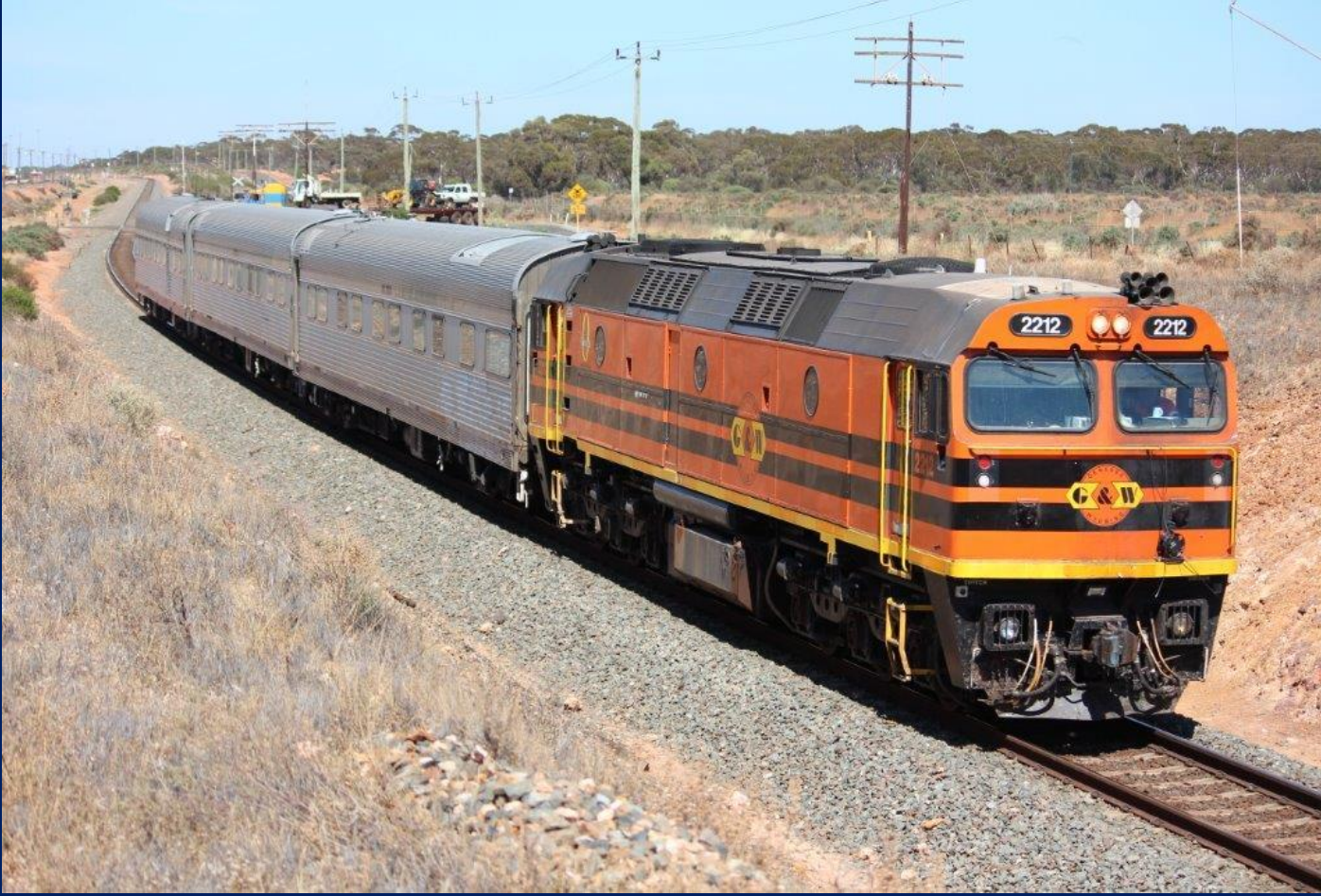
2212 runs AK car inspection train out of West Kalgoorlie as 7RC1 returning interstate PK82 on ARTC 24/10.