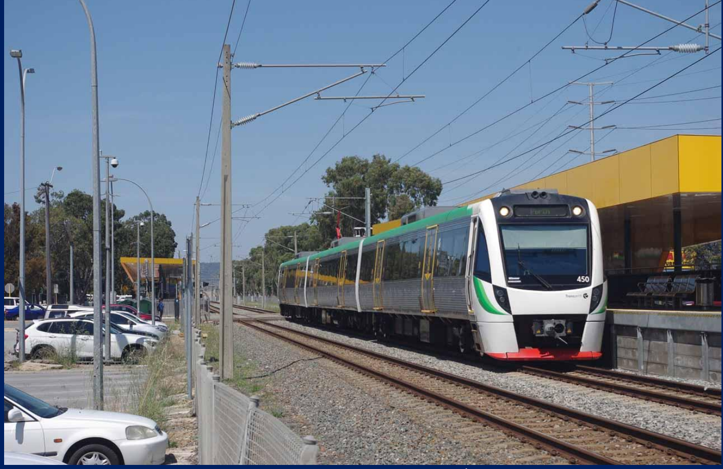
B series set 50 at Beckenham on Armadale line during Show week 28/9.