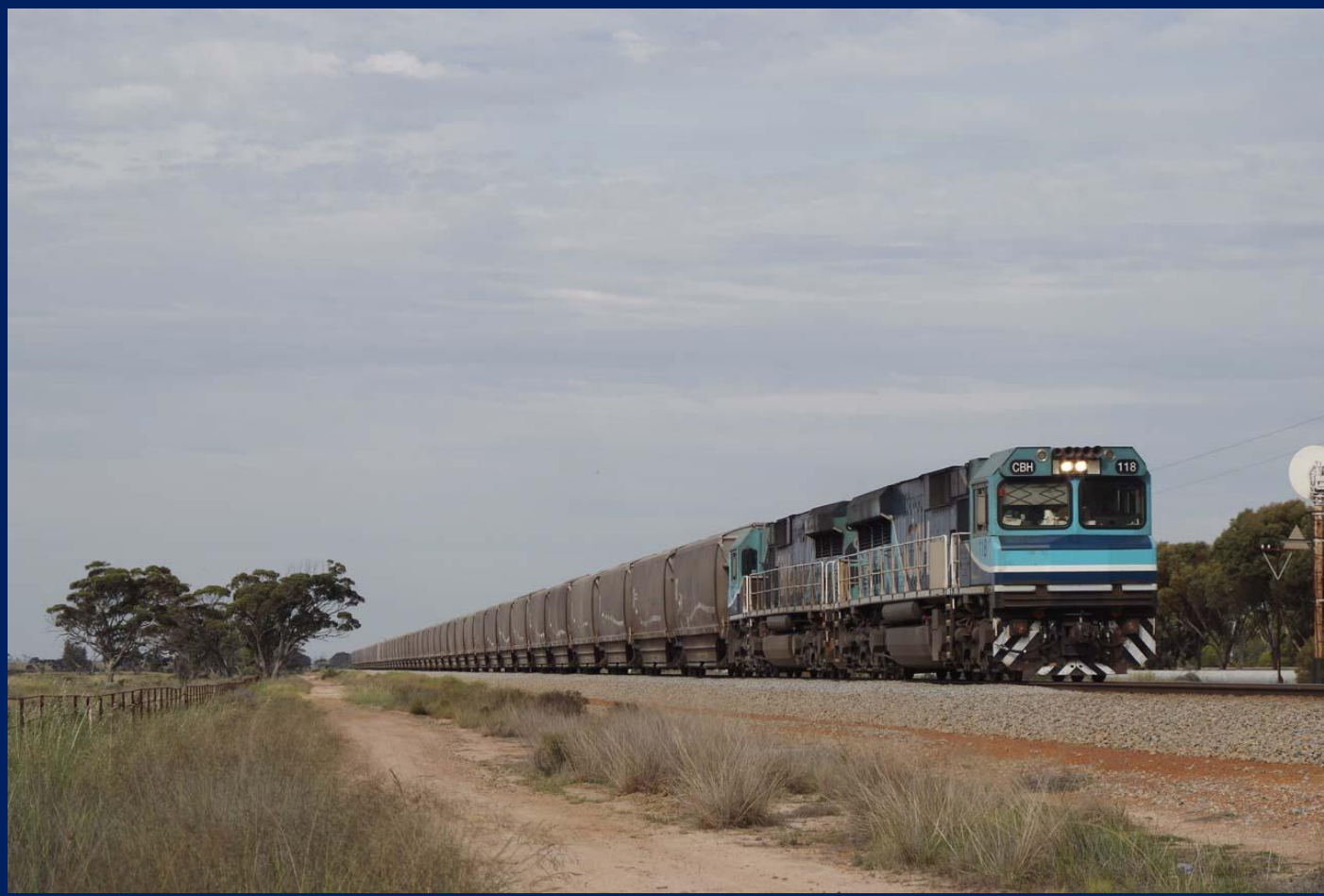
CBH118 & CBH122 on 6S58 Watco grain at Cunderdin October 2nd.