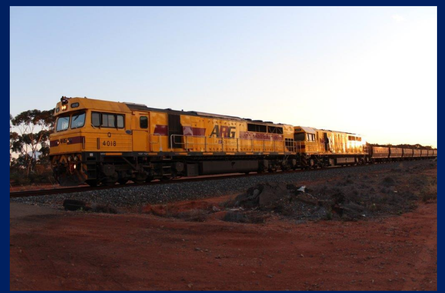
Q4018 & Q4010 on 1413 loaded ore ex Koolyanobbing with Q4002 & Q4001 DPU, at Binduli 18/10.