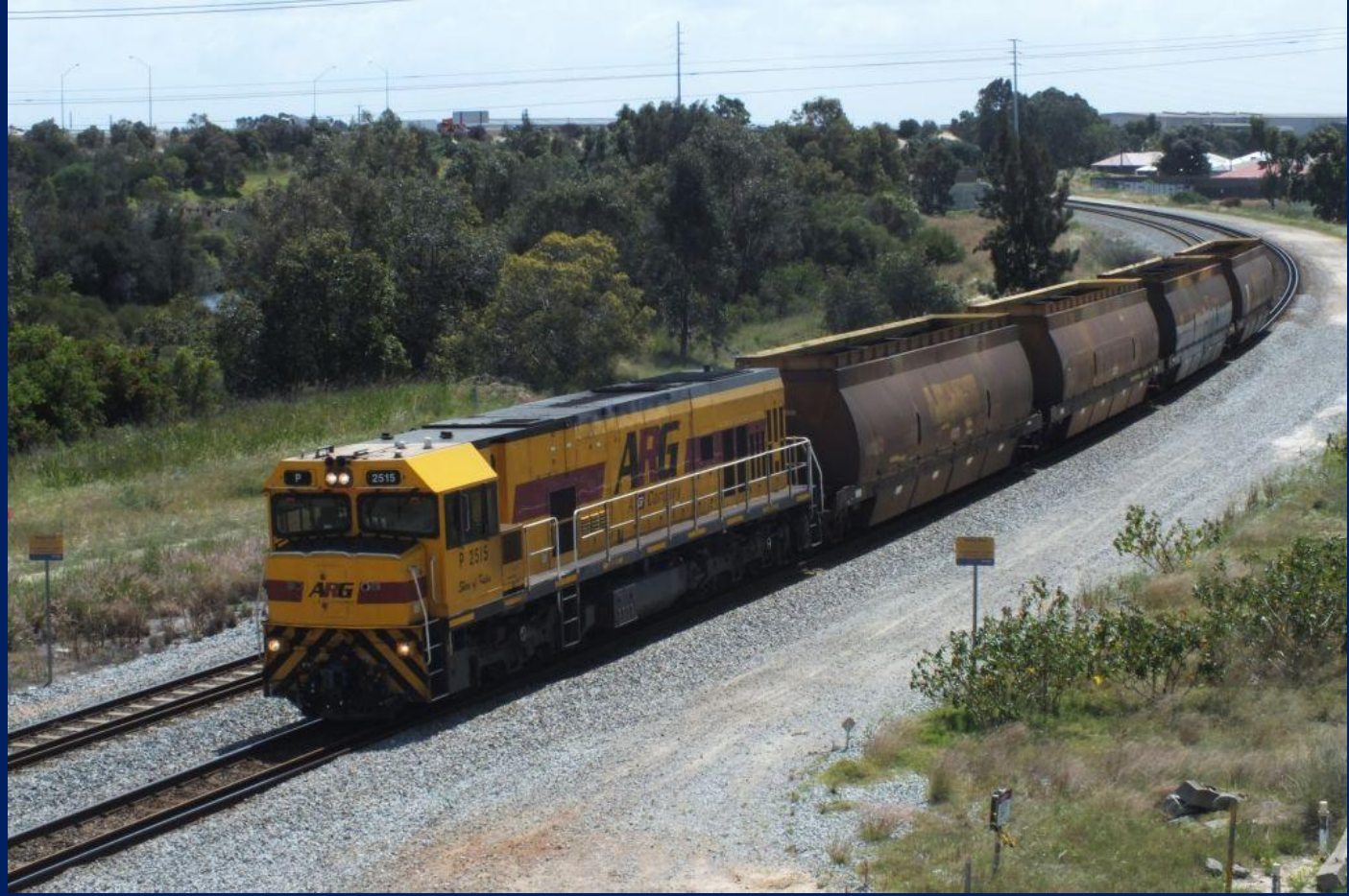
P2515 on 2120 empty XOA wagons Forrestfield to Kwinana at Wattle Grove October 5th.