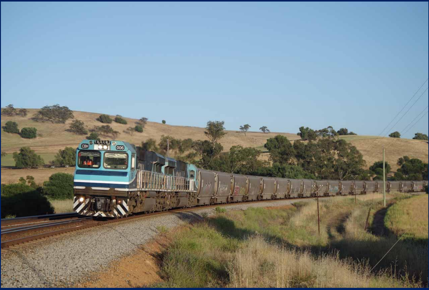
CBH006 & CBH001 approaching Avon Yard on 5K05 empty Watco grain October 15th.