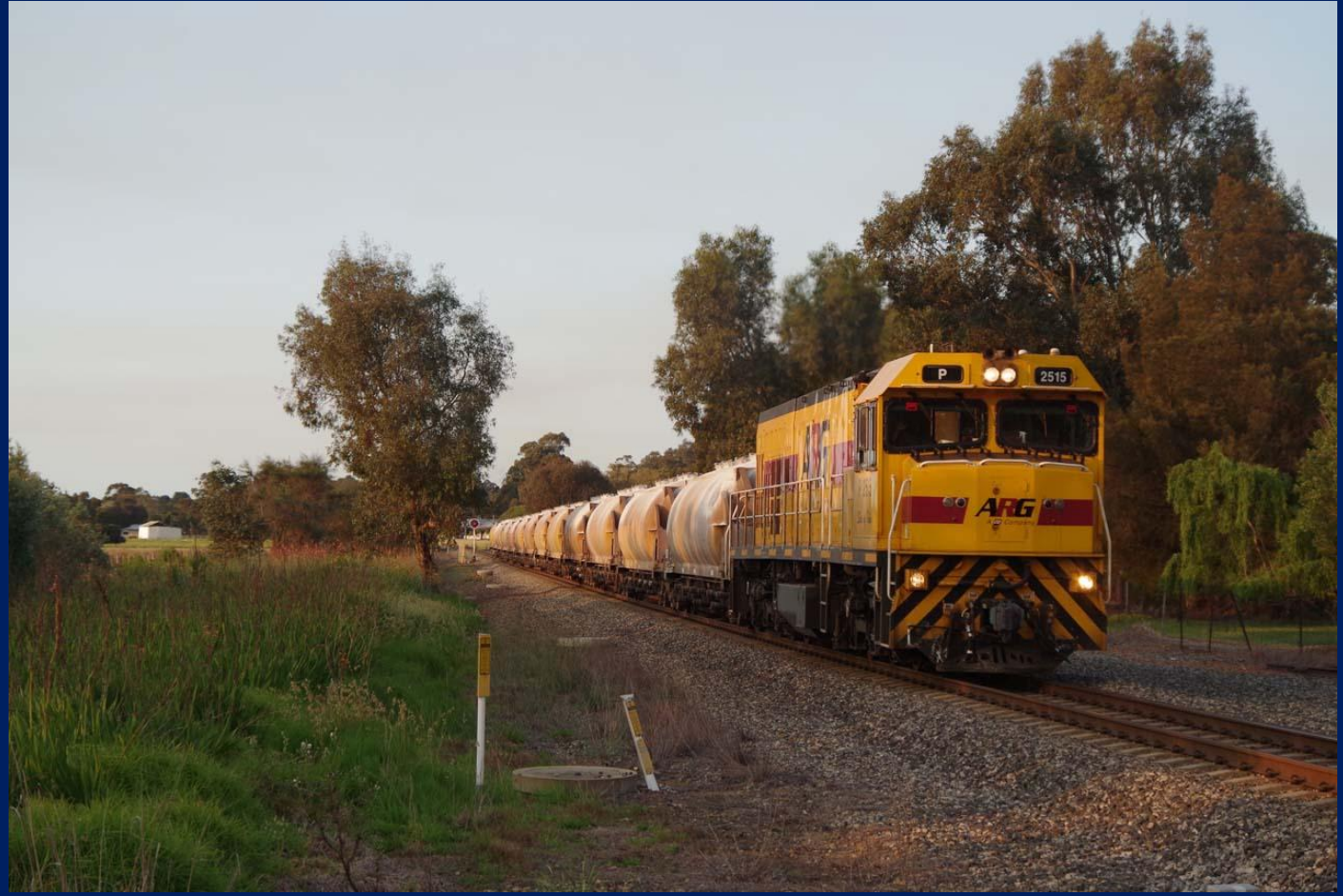
P2515 on 5271 lime train to Hamilton at Yarloop October 8th.