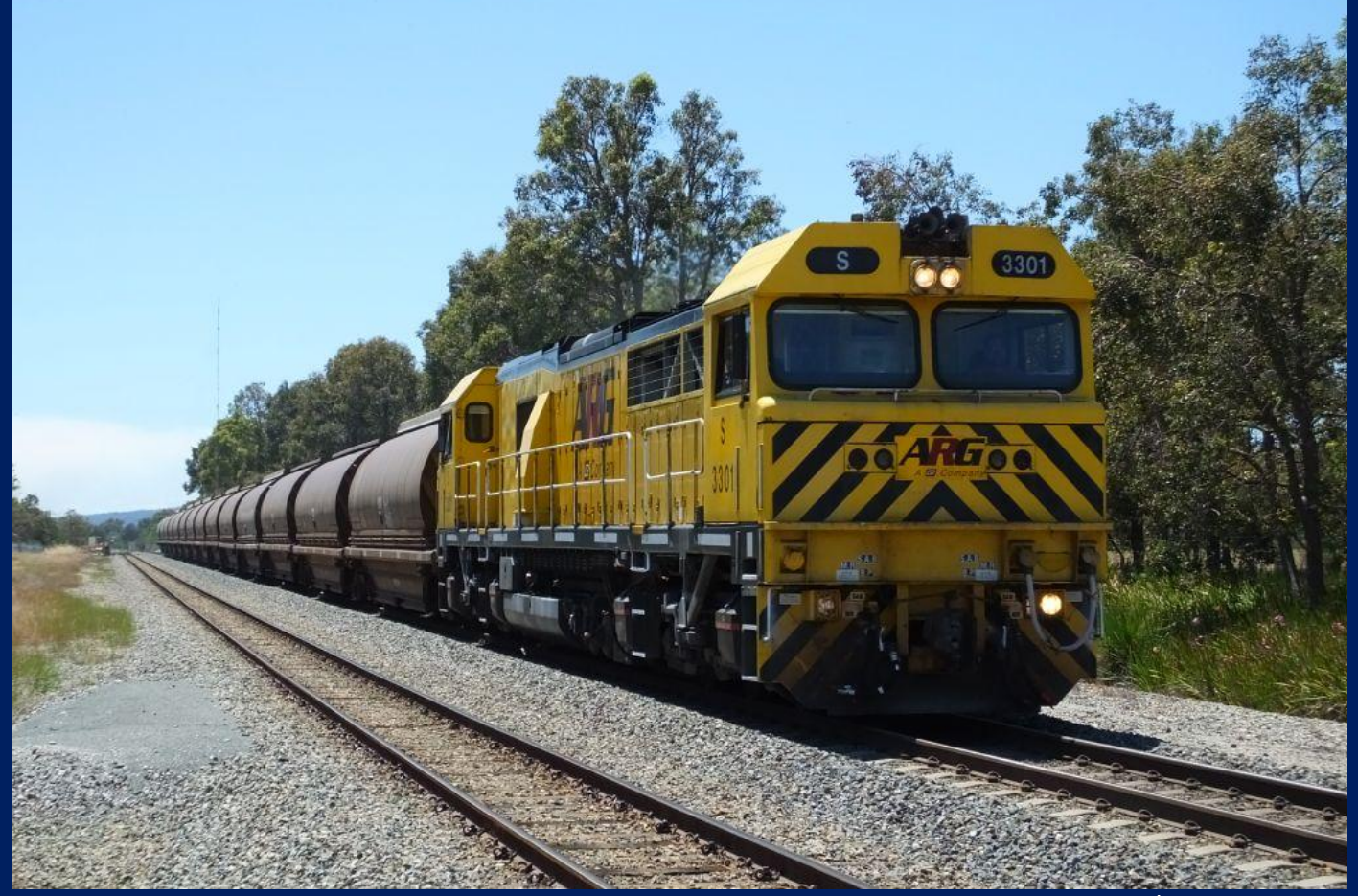
S3301 on 2121 hauls rare working of grain wagons to Picton from Kwinana at Mundijong 26/10.