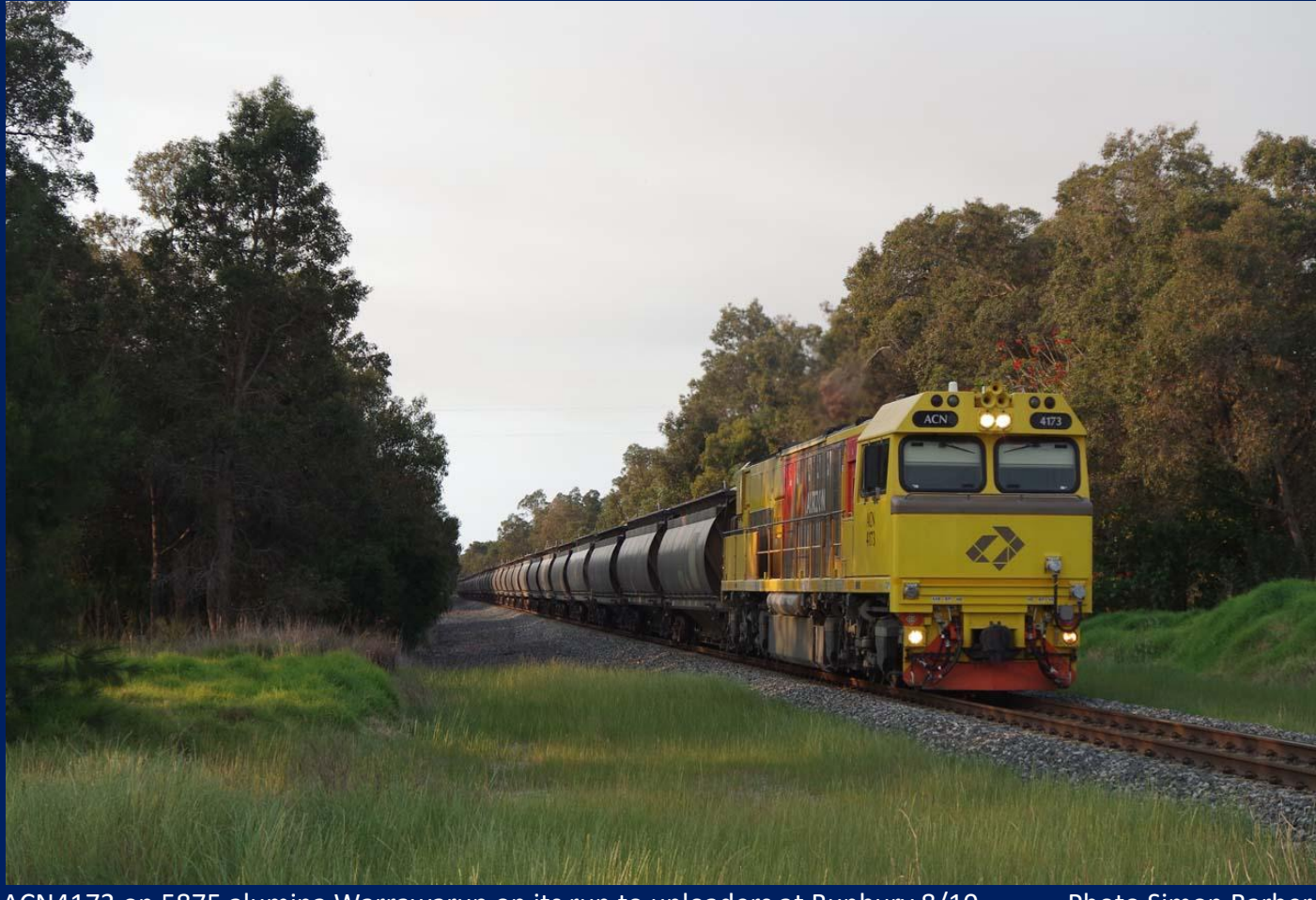
ACN4173 on 5875 alumina Warrawarup on its run to unloaders at Bunbury 8/10.