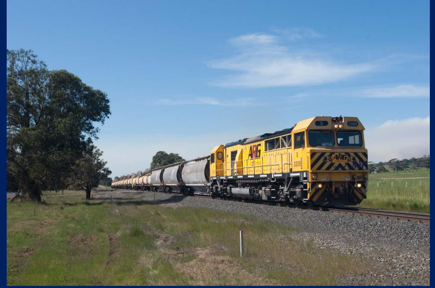
S3306 on 5852 empty caustic tankers at Brunswick Junction October 8th.