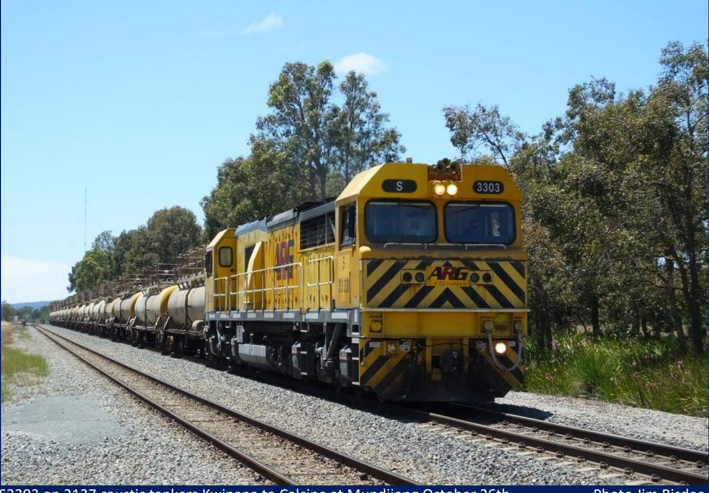
S3303 on 2137 caustic tankers Kwinana to Calcine at Mundijong October 26th. Photo