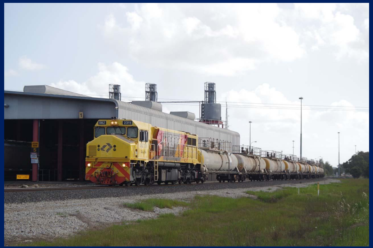
DBZ2311 on 2853 caustic tankers at Picton on October 5th.