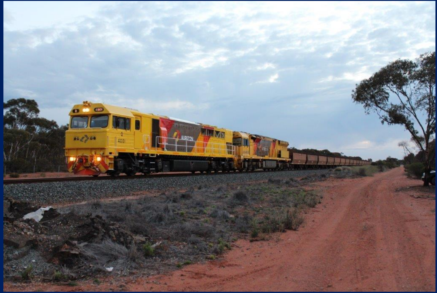
Q4001 & ACB4403 on 1413 loaded Cliffs ore to Esperance at Binduli September 27th.