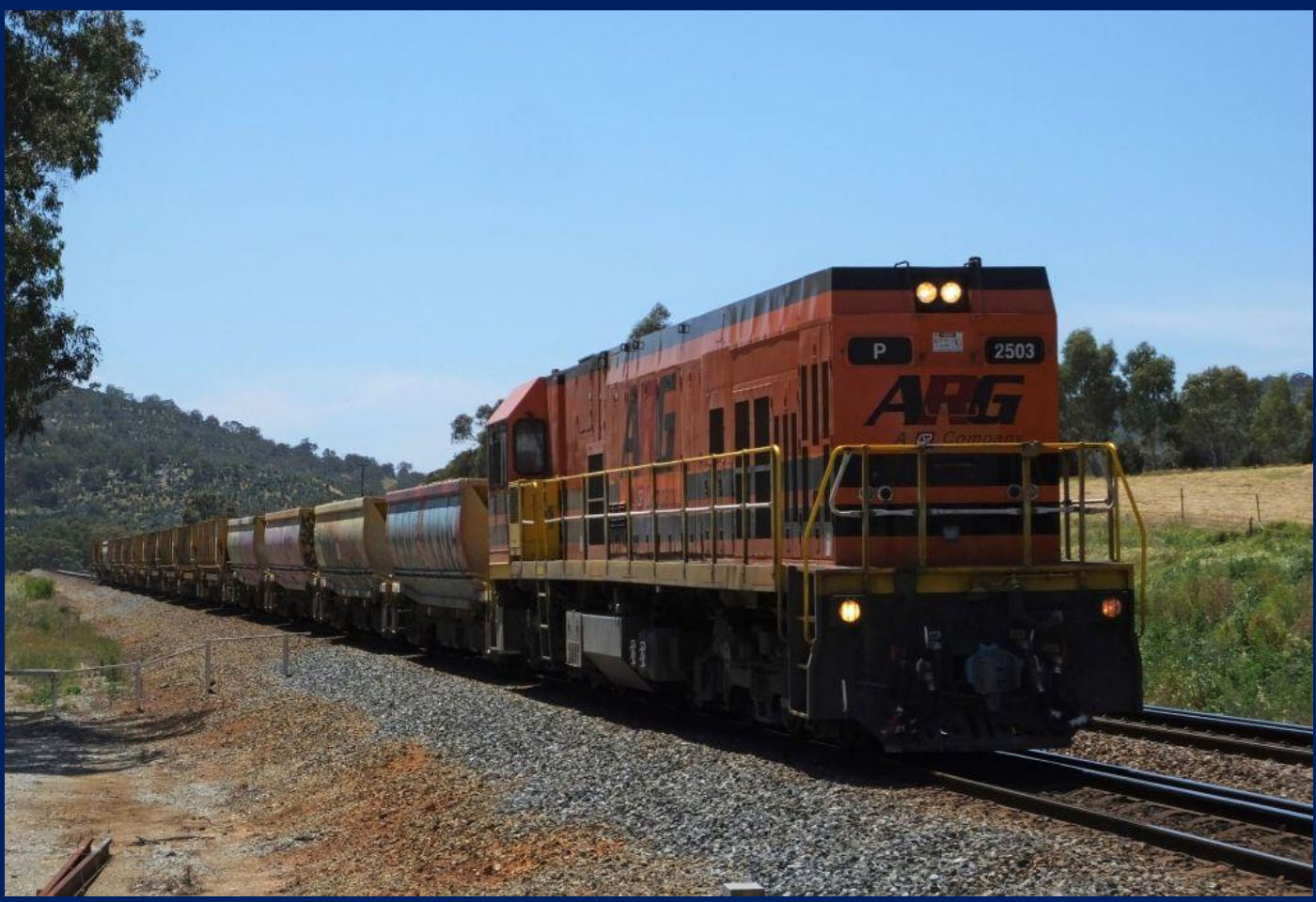
P2503 on 6AB2 empty ballast runs wrong line owing to track work at Brigadoon on 30/10.