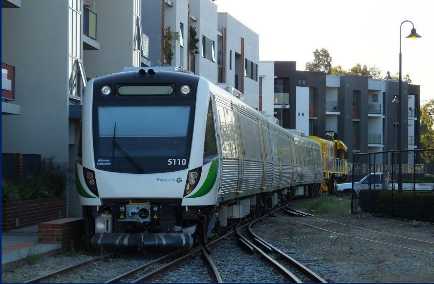
EMU set 110 passing apartment blocks in what was workshops yard Midland 9/10.