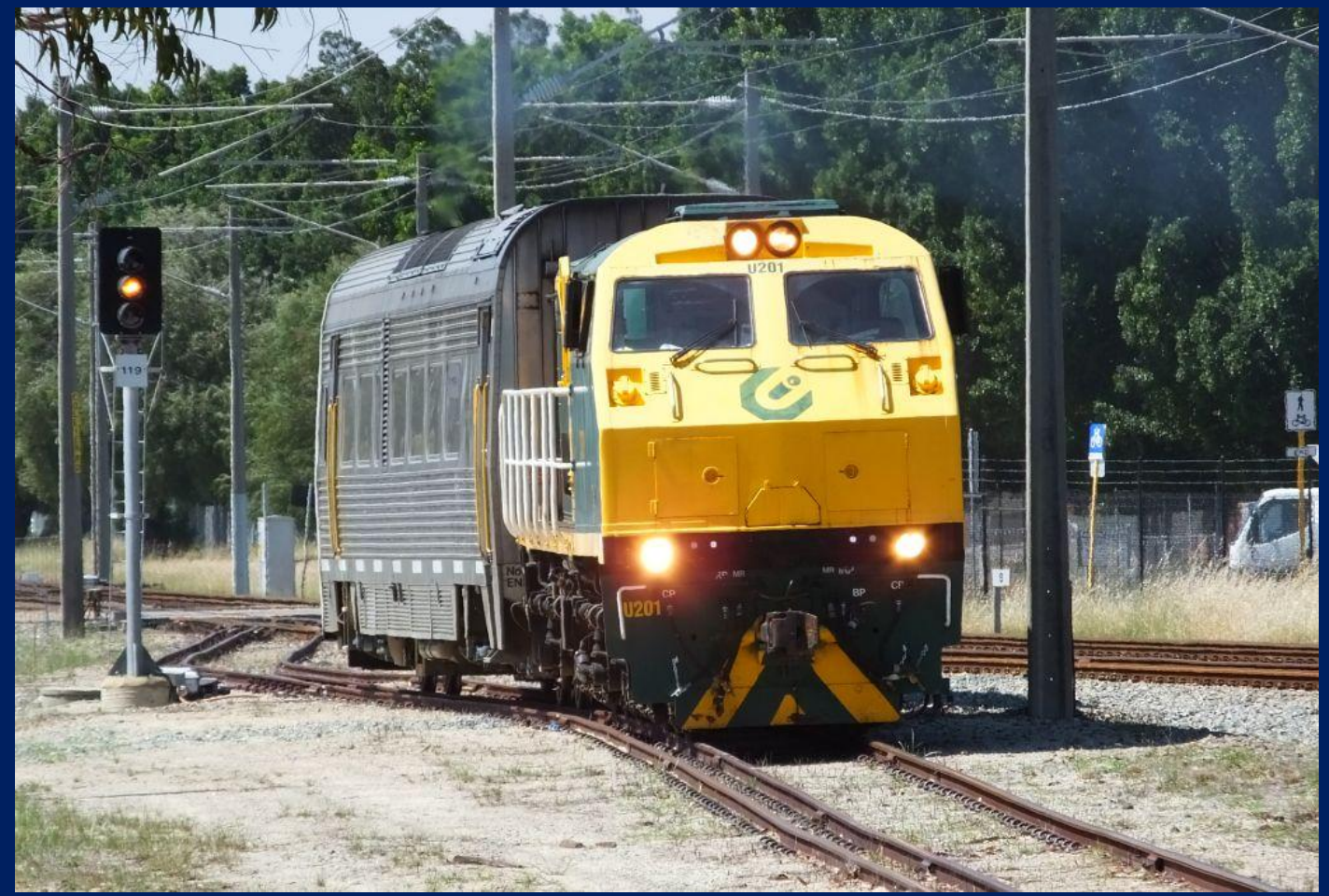
U201 propelling ADP101 Australind railcar out of PTA Bassendean siding October 9th.