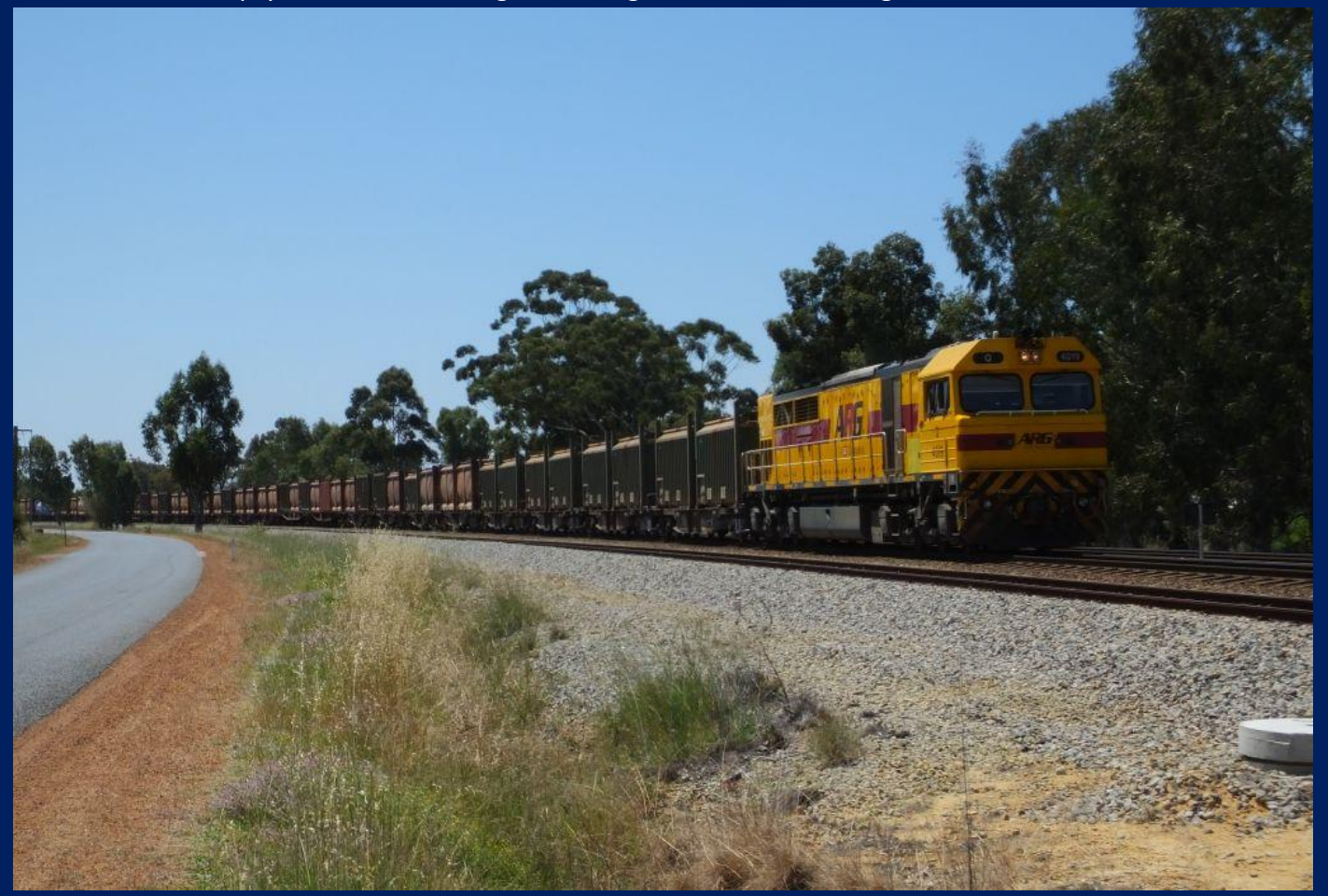
Q4019 on 5430 empty sulphur wrong line running Millendon Junction October 30th. Phot