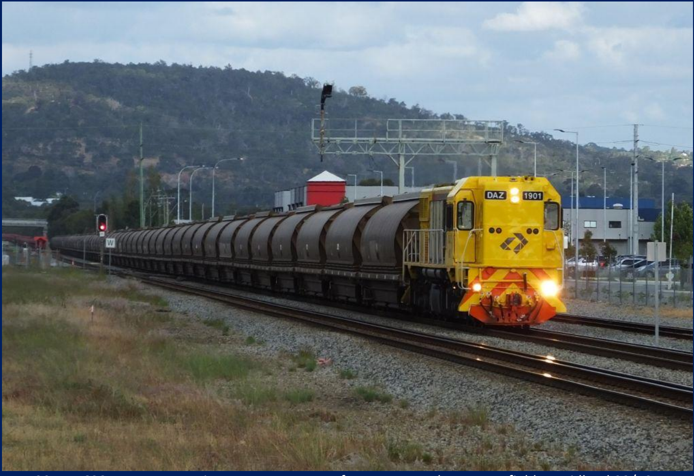
DAZ1901 on 6284 empty XT grain wagon movement from Avon Yard to Forrestfield at Midland 23/10.