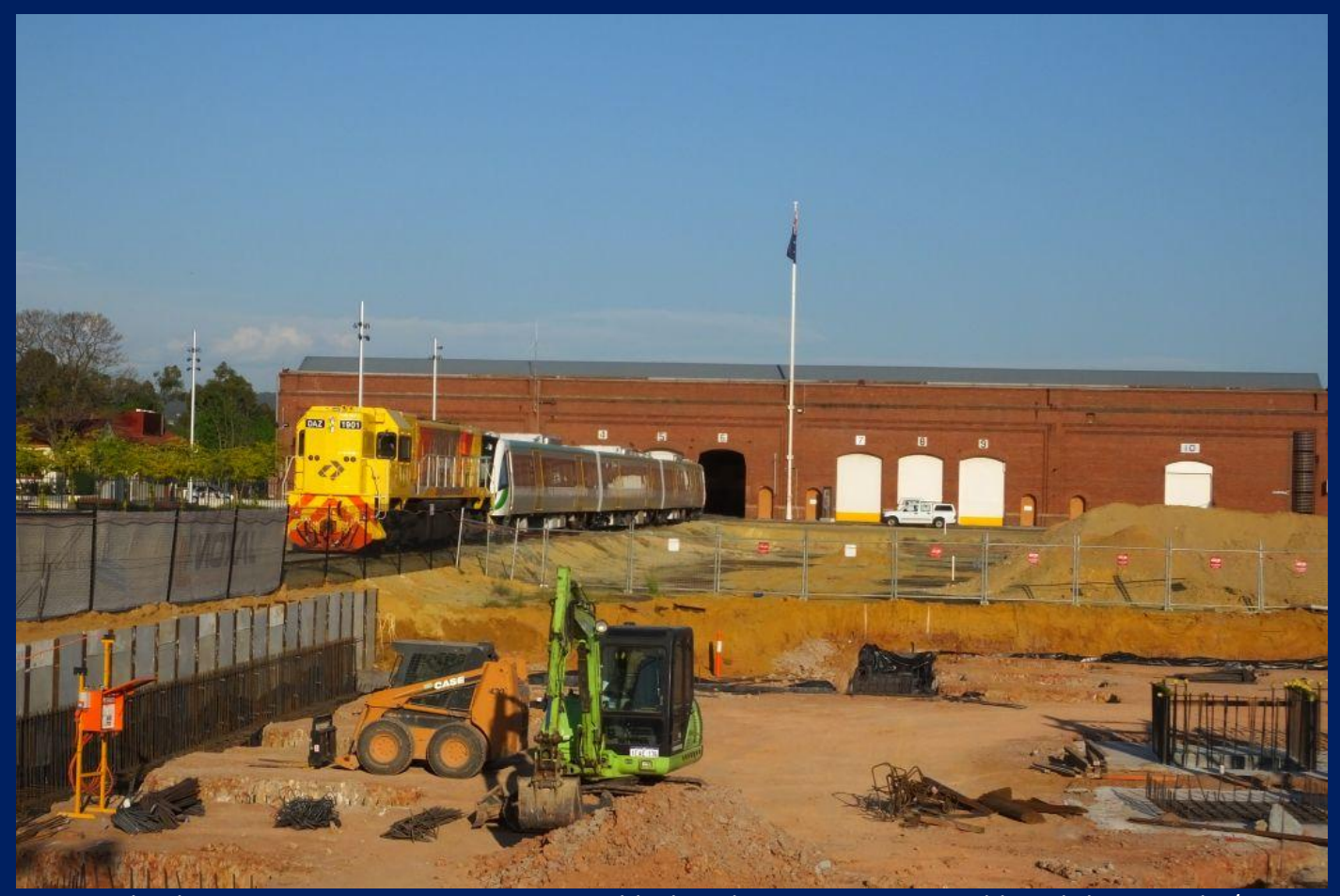
DAZ1901 hauls EMU set 110 past new apartment block under construction in old workshops yard 9/10.