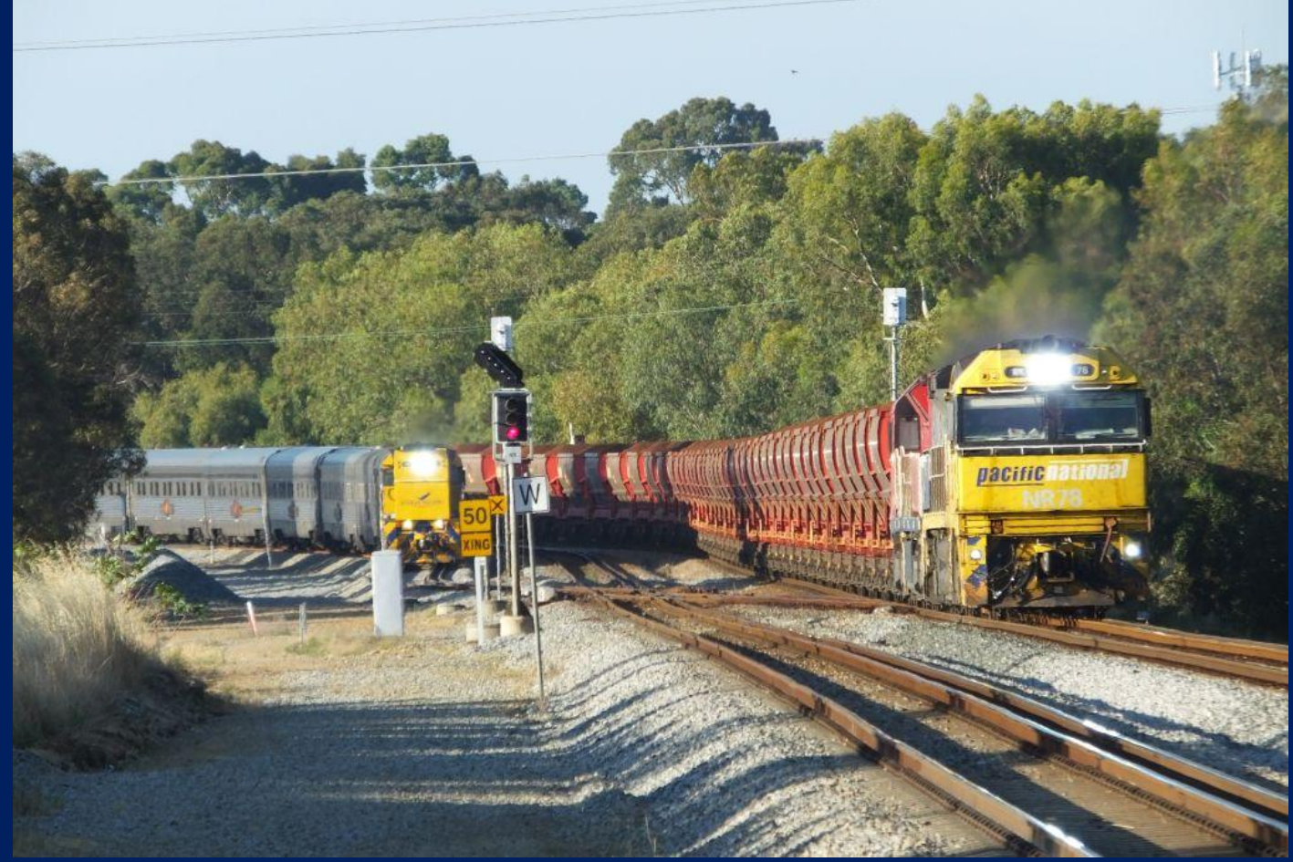
NR78 & MRL.004 on 7032 ore bypass NR28 on 7003 Indian Pacific cars at Hazelmere on 7003 28/11