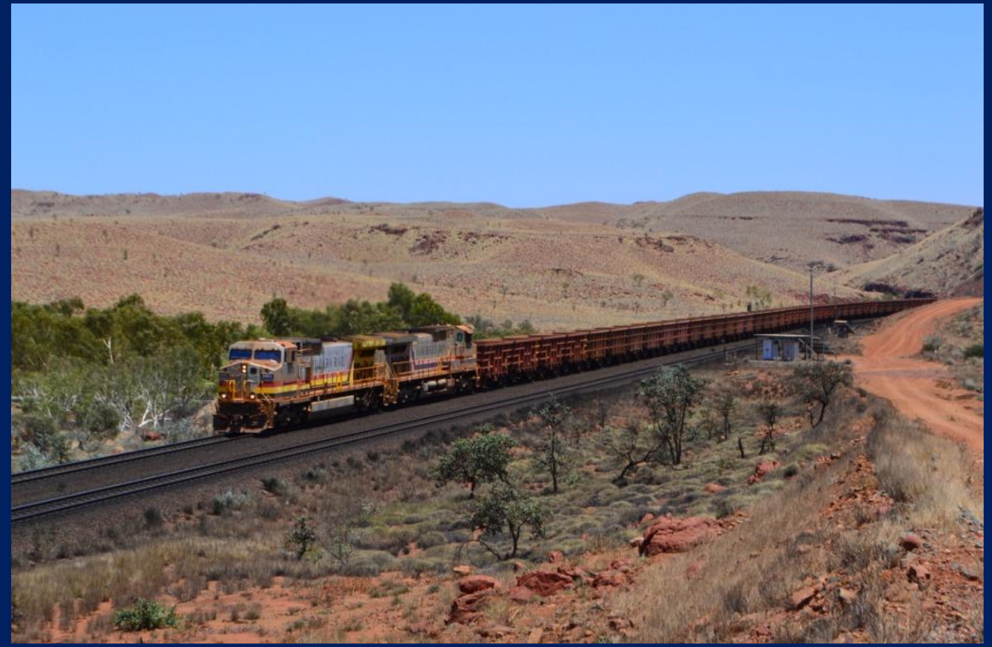
9403 & 7087 on empty ore near Gallah on Tom Price main line 11th November.