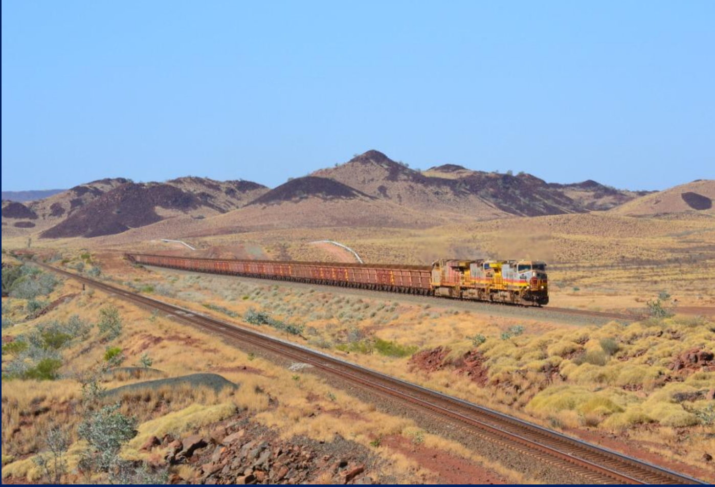
7050, 7057 & 8119 on loaded ore at Harding on duplicated Robe line 11th November.