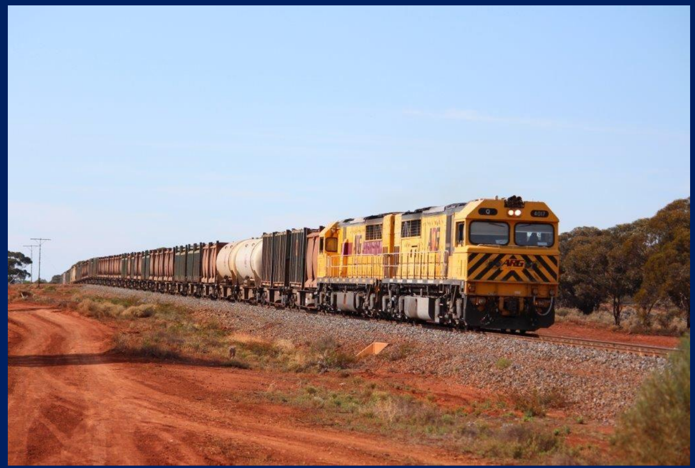
Q4017 & Q4010 on 7029 sulphur to Malcolm at 5km Leonora line 22nd November.