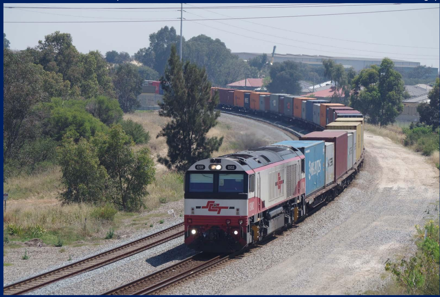
CSR002 on 4142 ILS intermodal at Welshpool 11th November.