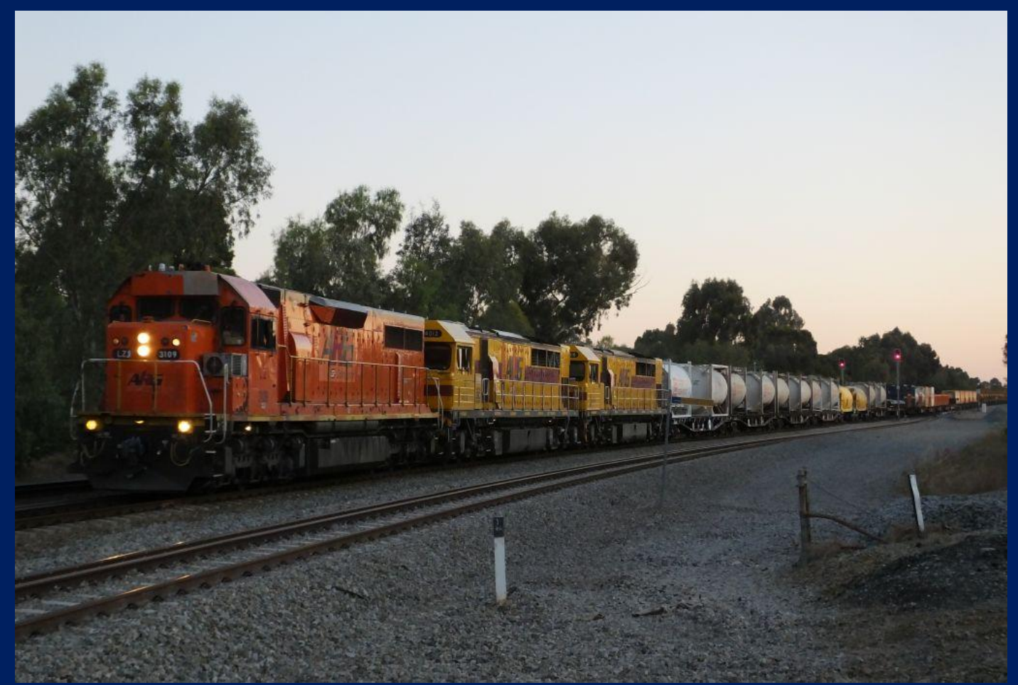
LZ3109, Q4012 & Q4016 on 1025 Kalgoorlie freight at Woodbridge 15th November.