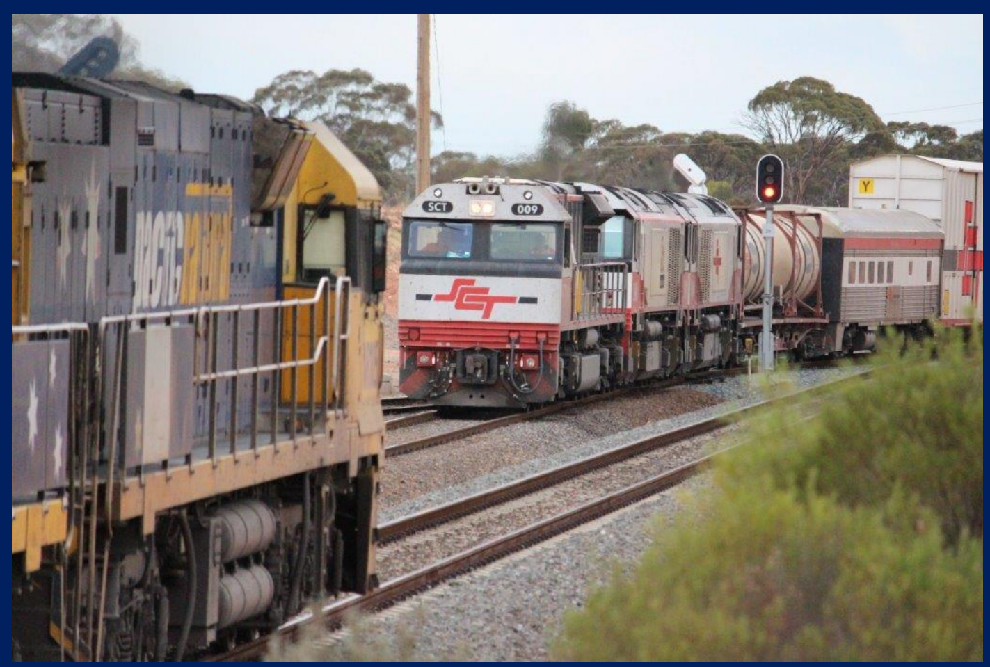
3MP4 crosses late SCT009, CSR010 & CSR004 on 4PM9 SCT entering WEK loop 5/11.