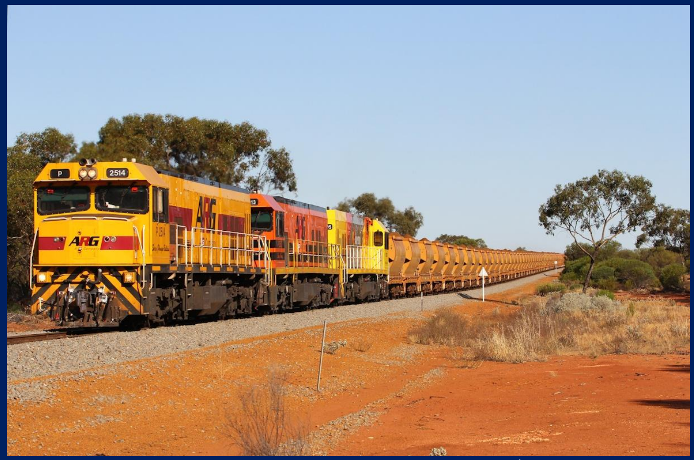
P2514, P2513 & P2005 on 3725 loaded Mt Gibson ore just south of Pintharuka 3/11.