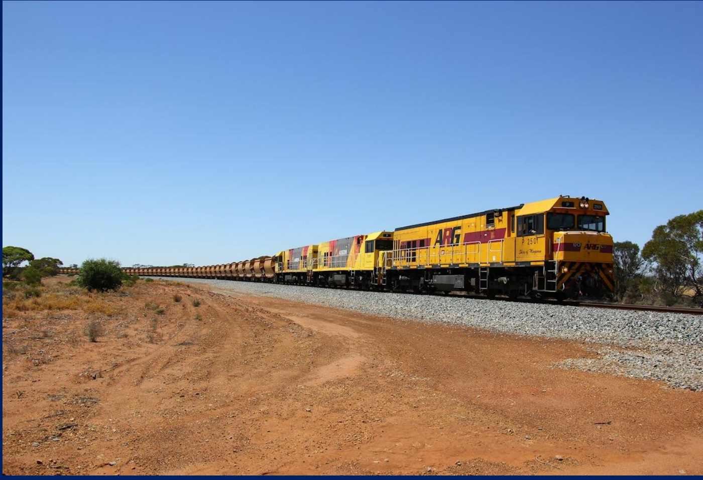
P2501, P2517 & P2504 on loaded Mt Gibson ore north of Sullivan 30th November.