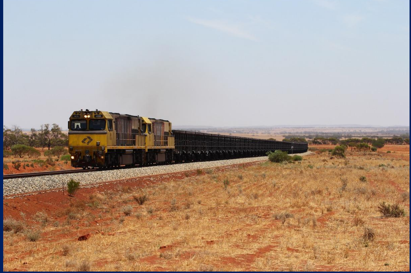
ACN4140 & ACN4152 on 7760 empty Karara ore at 18km on Tilley to Karara line 28/11.