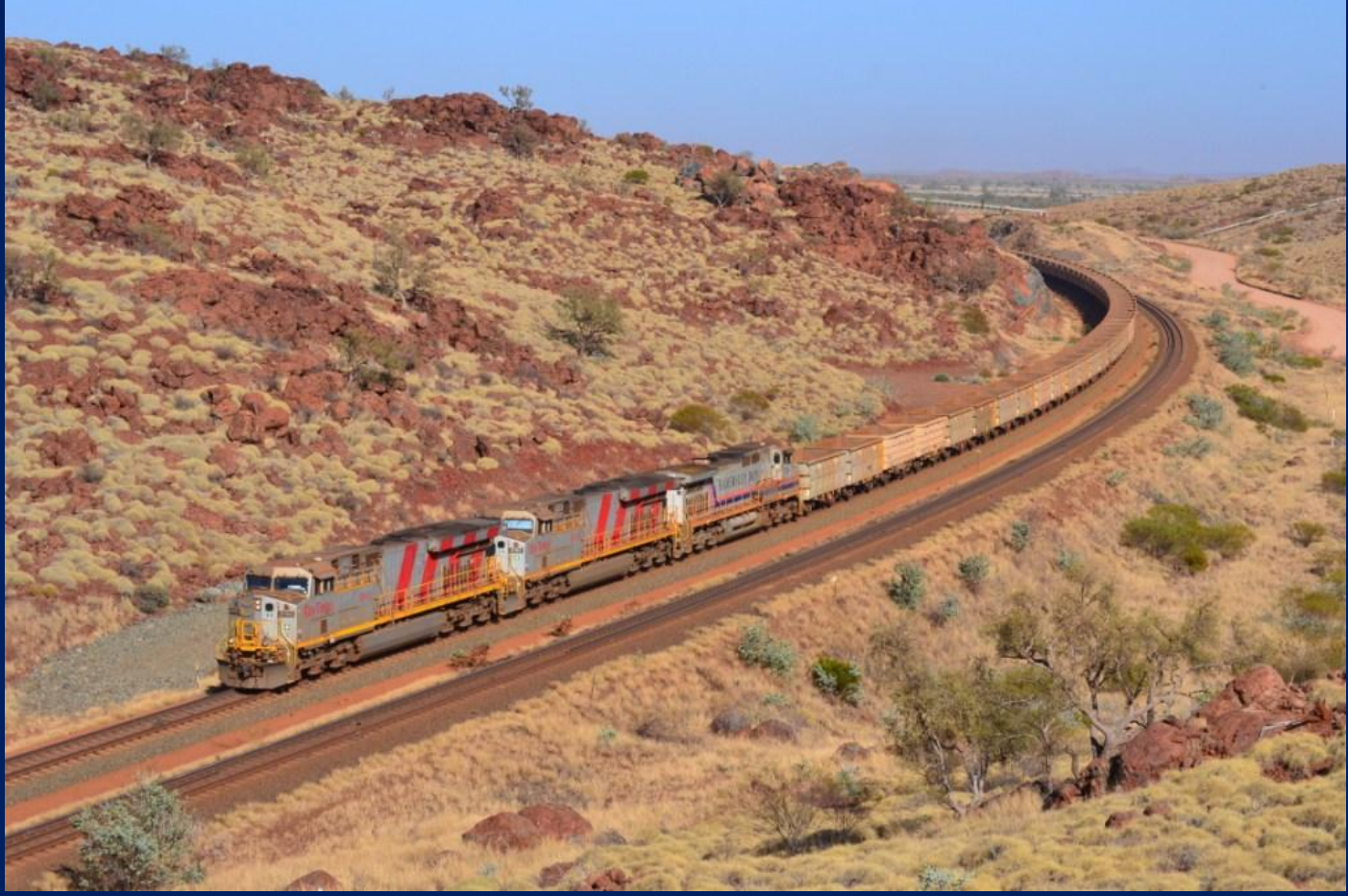
8160, 8193 & 7074 on empty at 38km on Robe River line 11th November.