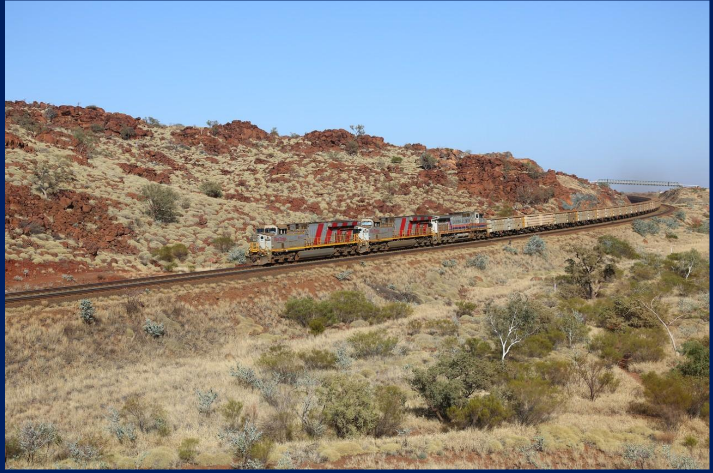
81160, 8193 & 7074 on empty ore at 38km Cape Lambert line 11/11.