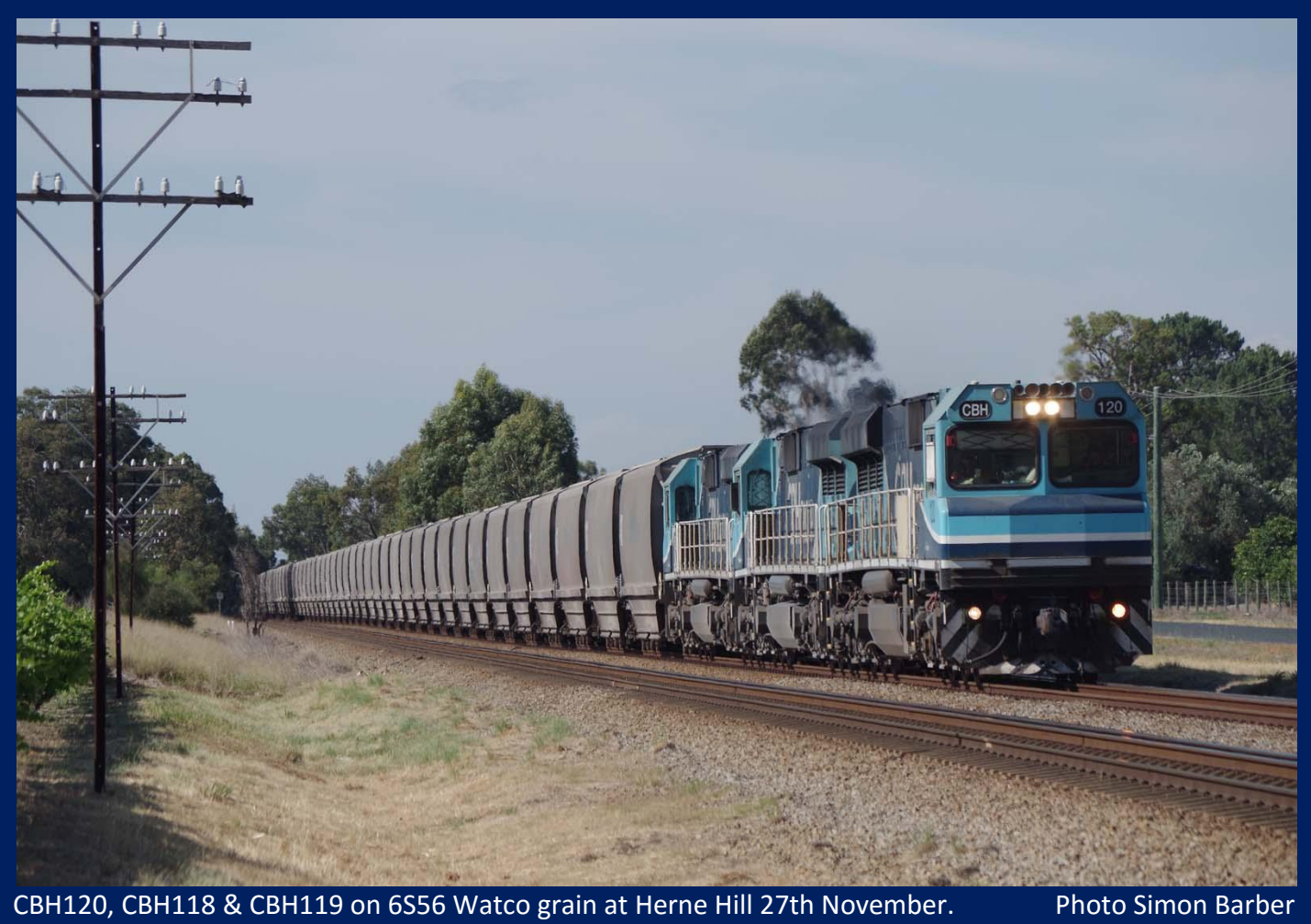
Page 11 of 25