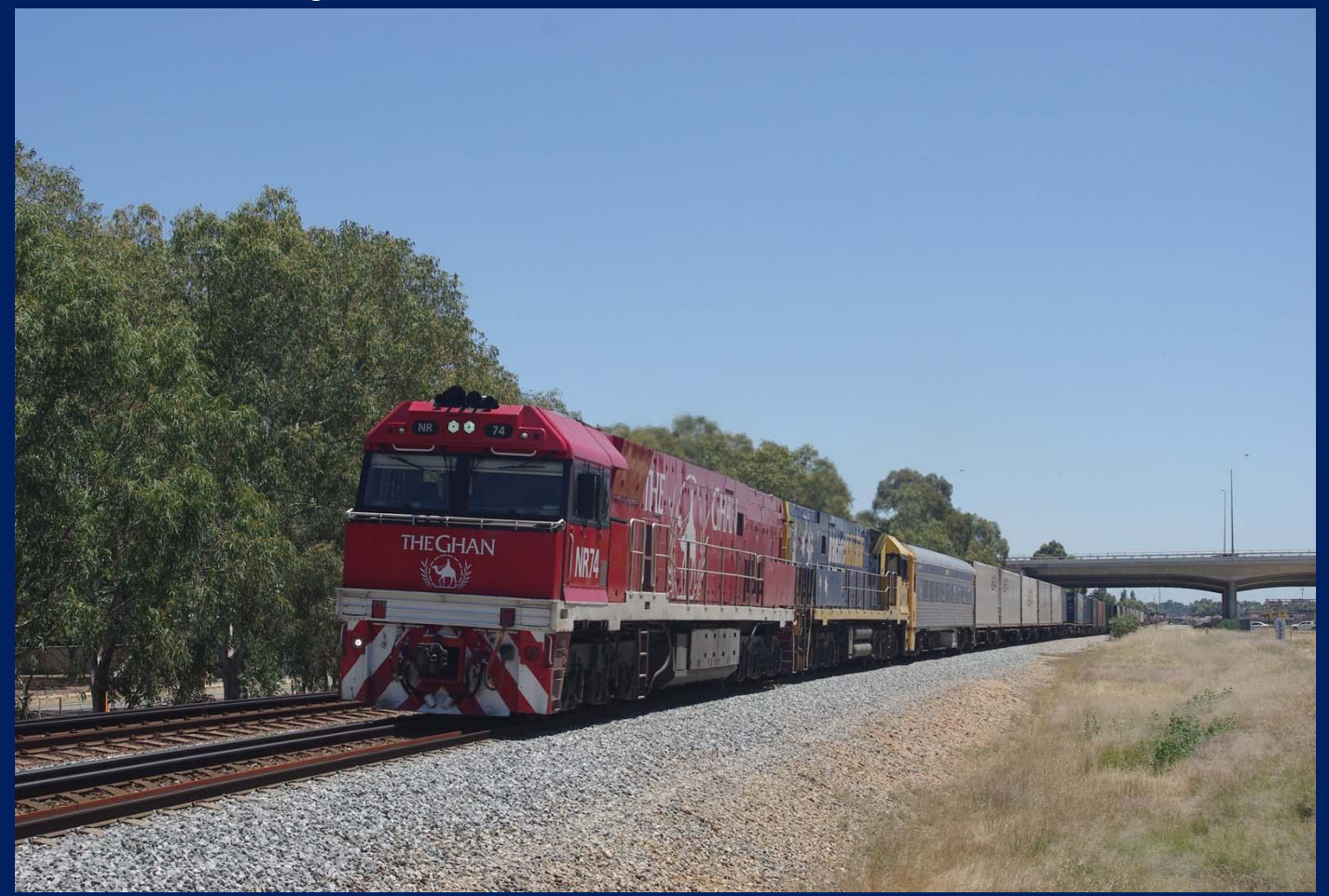
NR74 & NR16 on 1MP7 express at Bellevue 8th November.