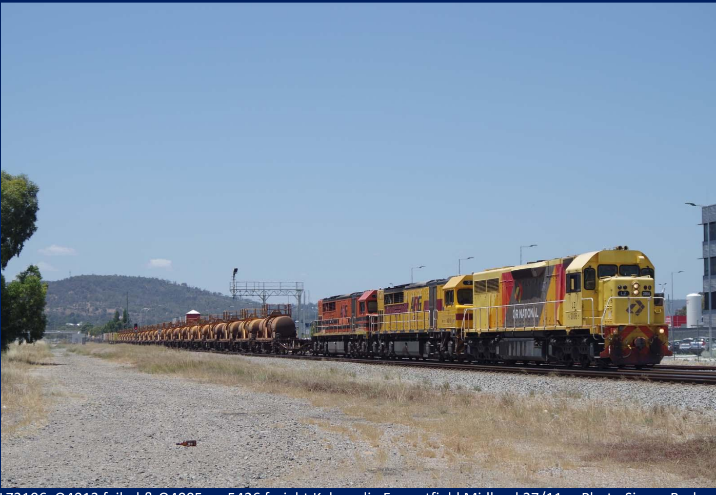
LZ3106, Q4013 failed & Q4005 on 5426 freight Kalgoorlie Forrestfield Midland 27/11.