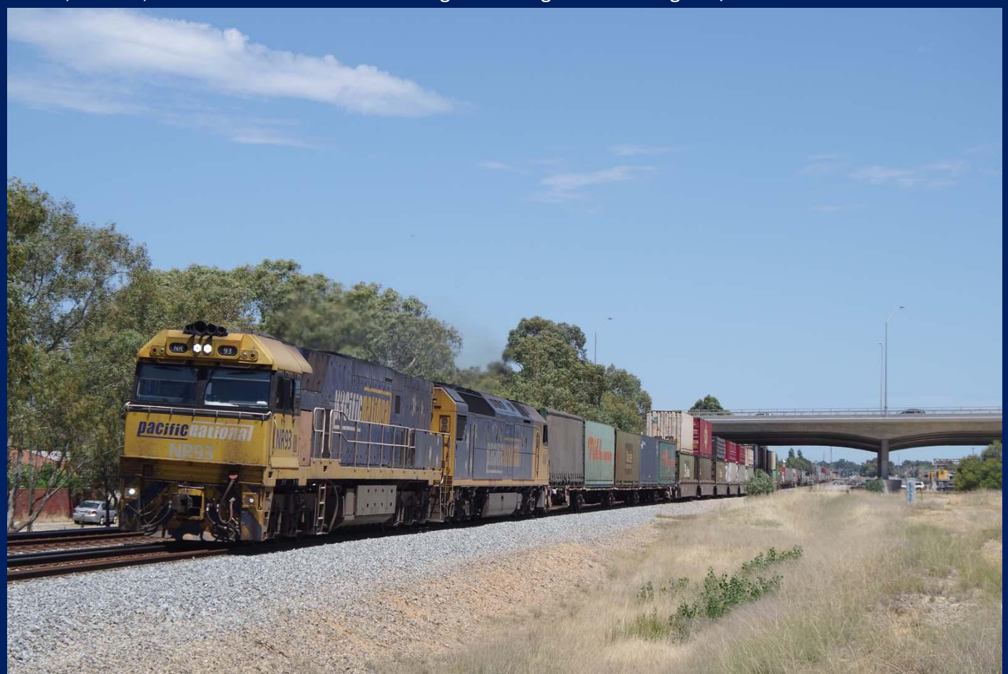
NR93 & AN6 on late 6PM6 intermodal at Bellevue 14th November.