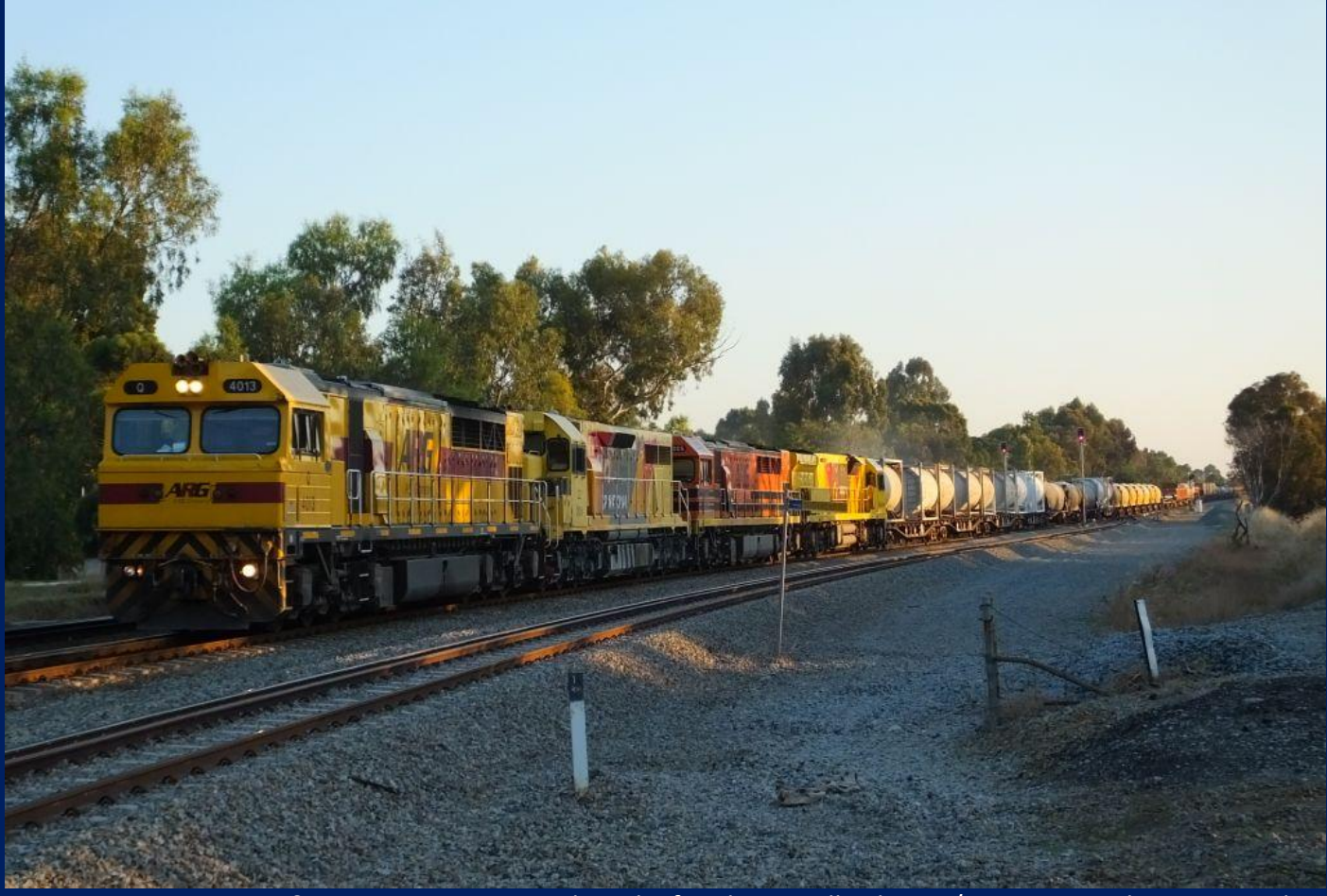
Q4013, LZ3106, Q4005 & ACB4401 on 7025 Kalgoorlie freight Woodbridge 28/11.