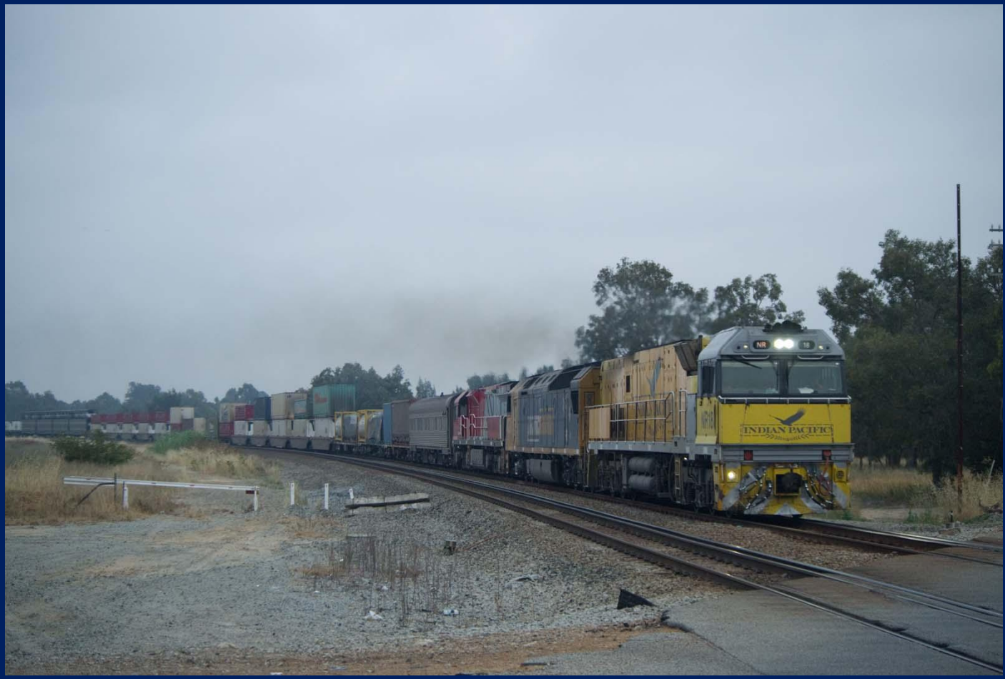
NR18, AN5 with returning MRL005 on 2MP5 at Stratton 29th October.