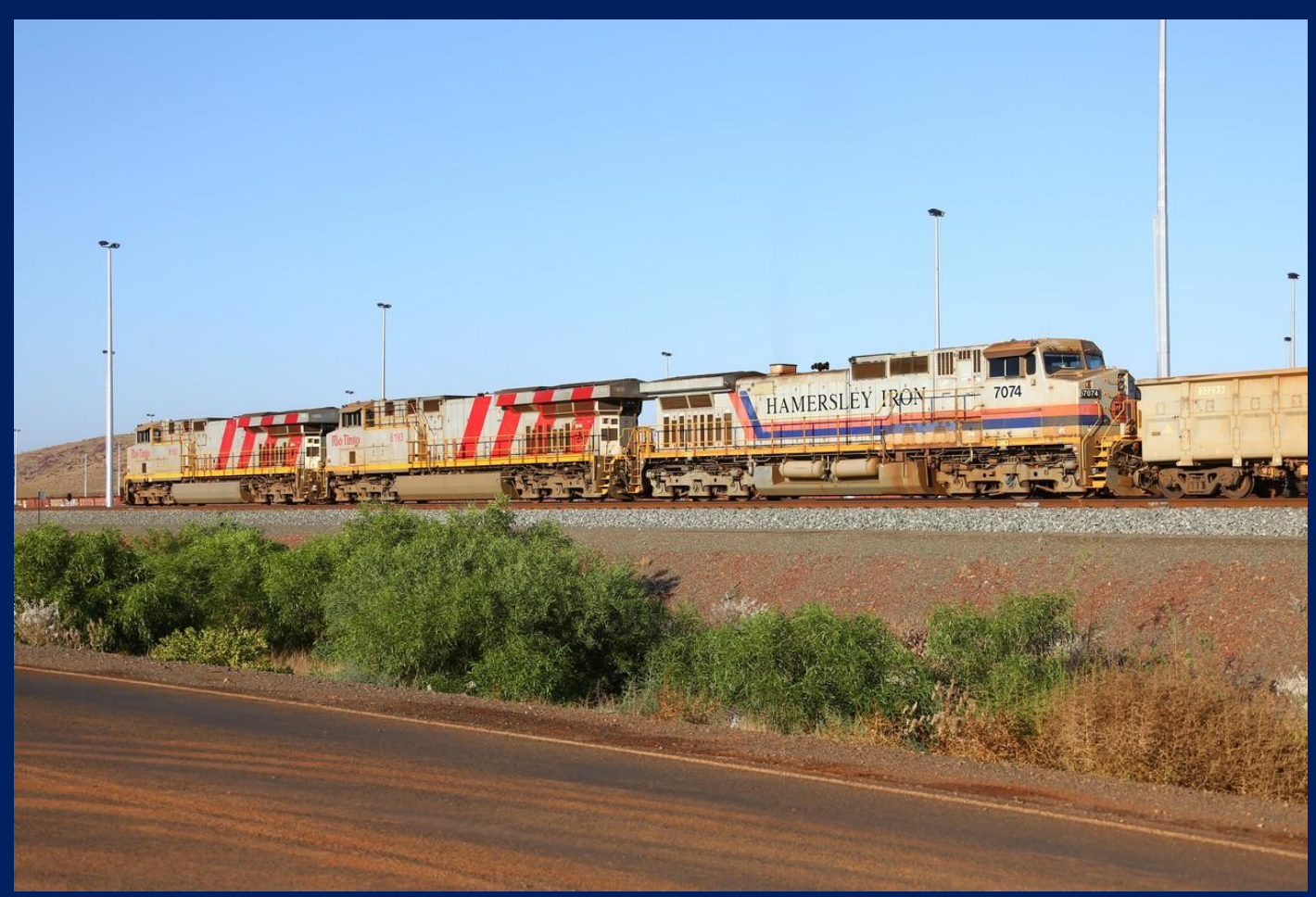
9-44CW 7074 showing its age with ES44DCi 8160 & 8193 on empty ore Cape Lambert Yard 11/11