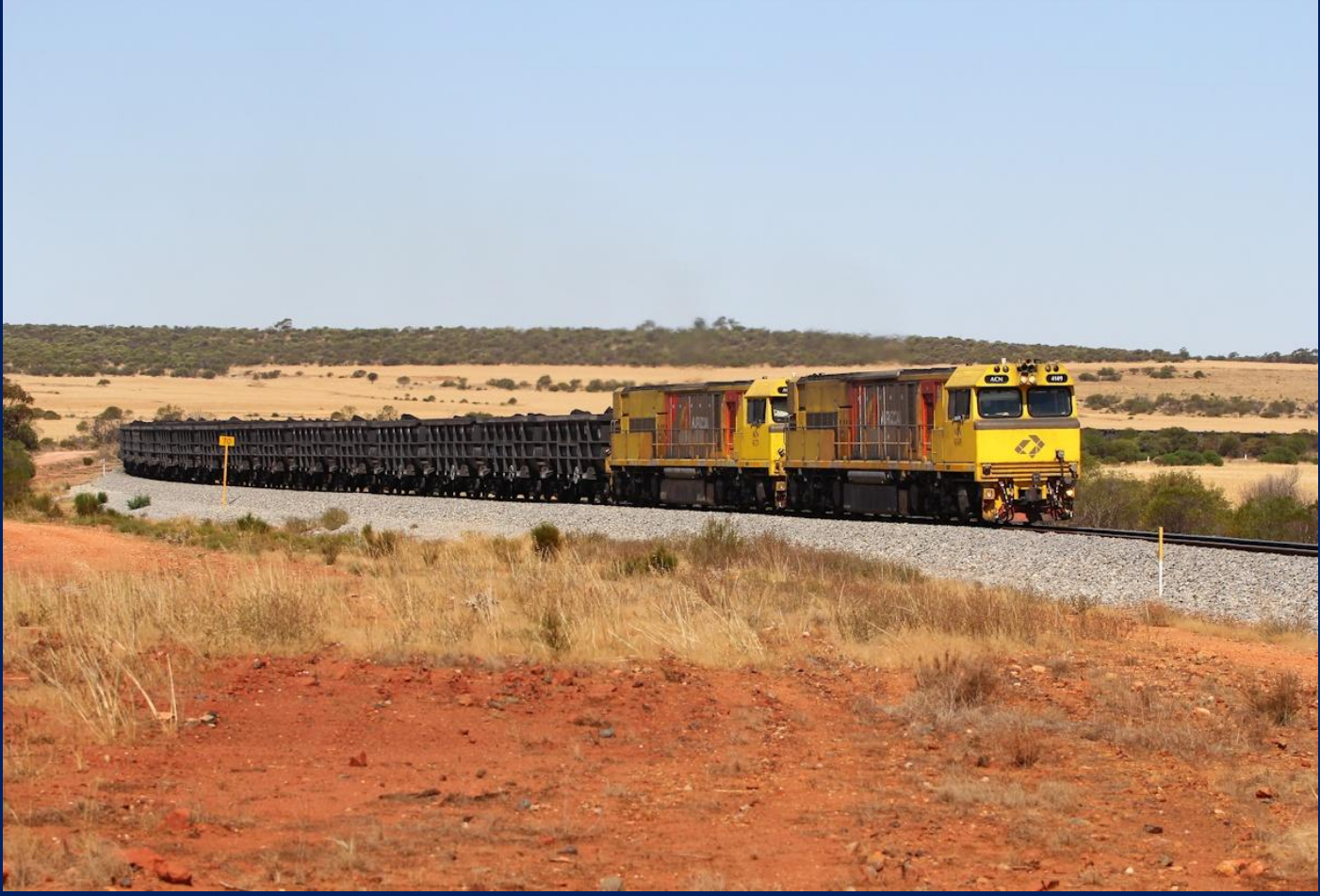
ACN4149 & ACN4171 on 3763 loaded Karara ore to Gerladton south of Tardun 3/11.