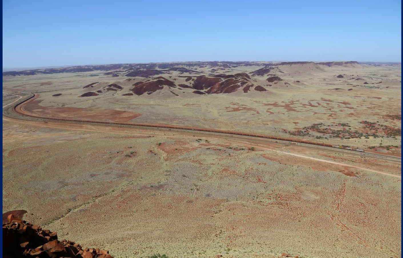
8113, 8145 & 9433 on loaded at 54km Robe line from Table Hill 11/11.