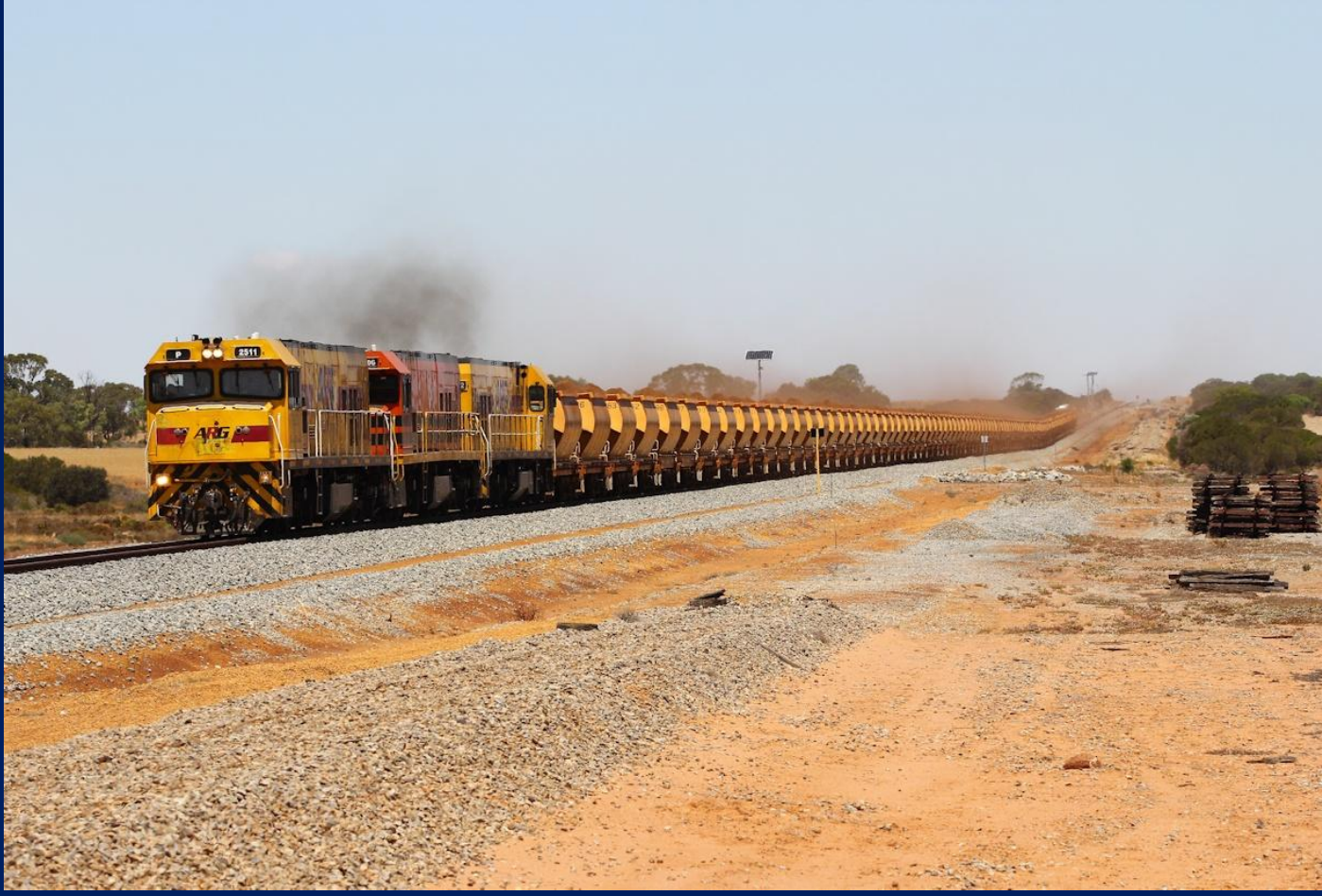
P2511, P2506 & P2502 on 3721 loaded Mt Gibson ore just north of Dean 3rd November.