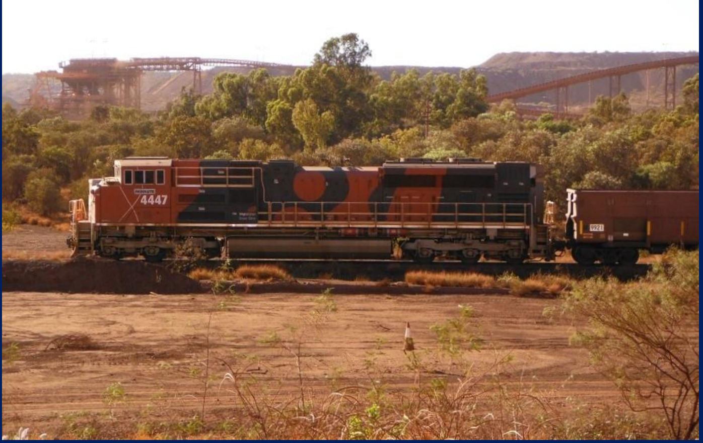
SD70Ace 4447 at Mt Newman 6th November.