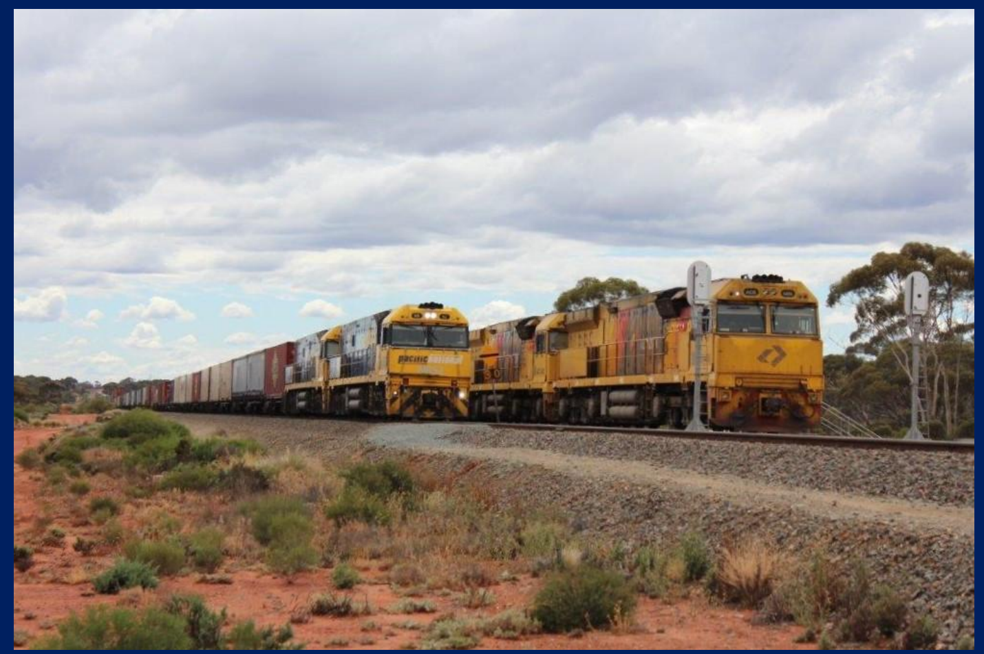
NR52 & NR117 on 5SP5 bypassing ACB4406 & ACB4405 on 6418 empty ore Binduli 7/11.