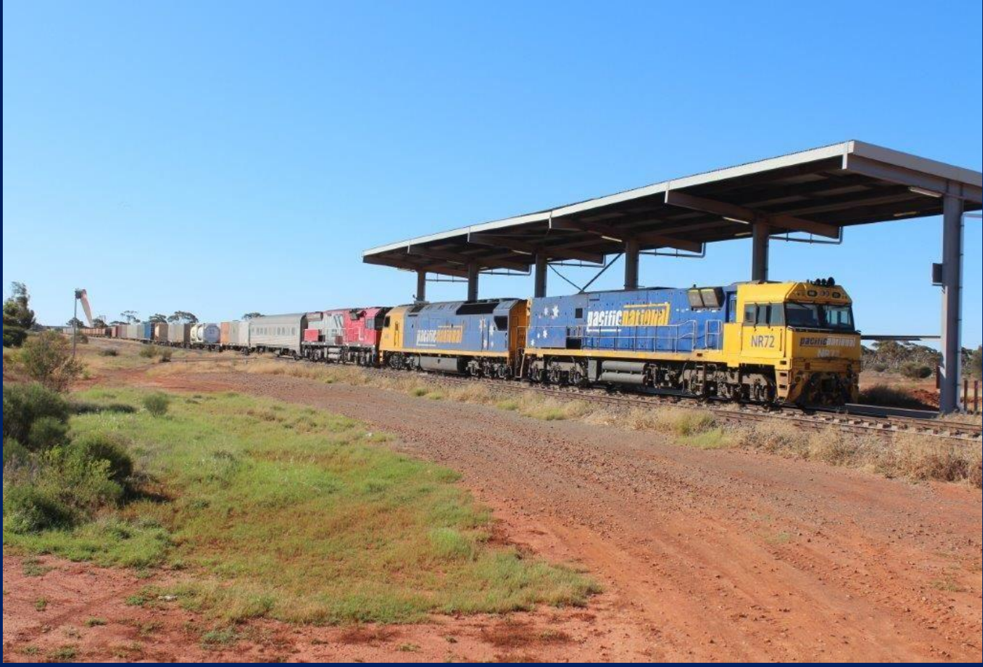
NR72, AN6, & MRL005 on 4PM4 steel at Parkeston on 19th November.