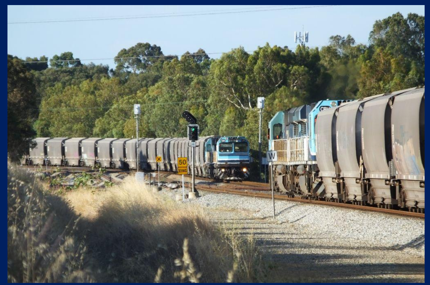
CBH008 & CBH002 on empty Watco grain crosses CBH120 & CBH118 on loaded at Woodbridge 29/11