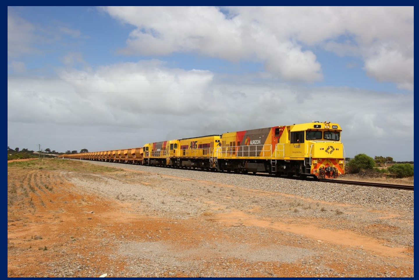
P2505, P2511 & P2504 on 7720 empty Mt Gibson ore to Perenjori at Narngulu 19/12.