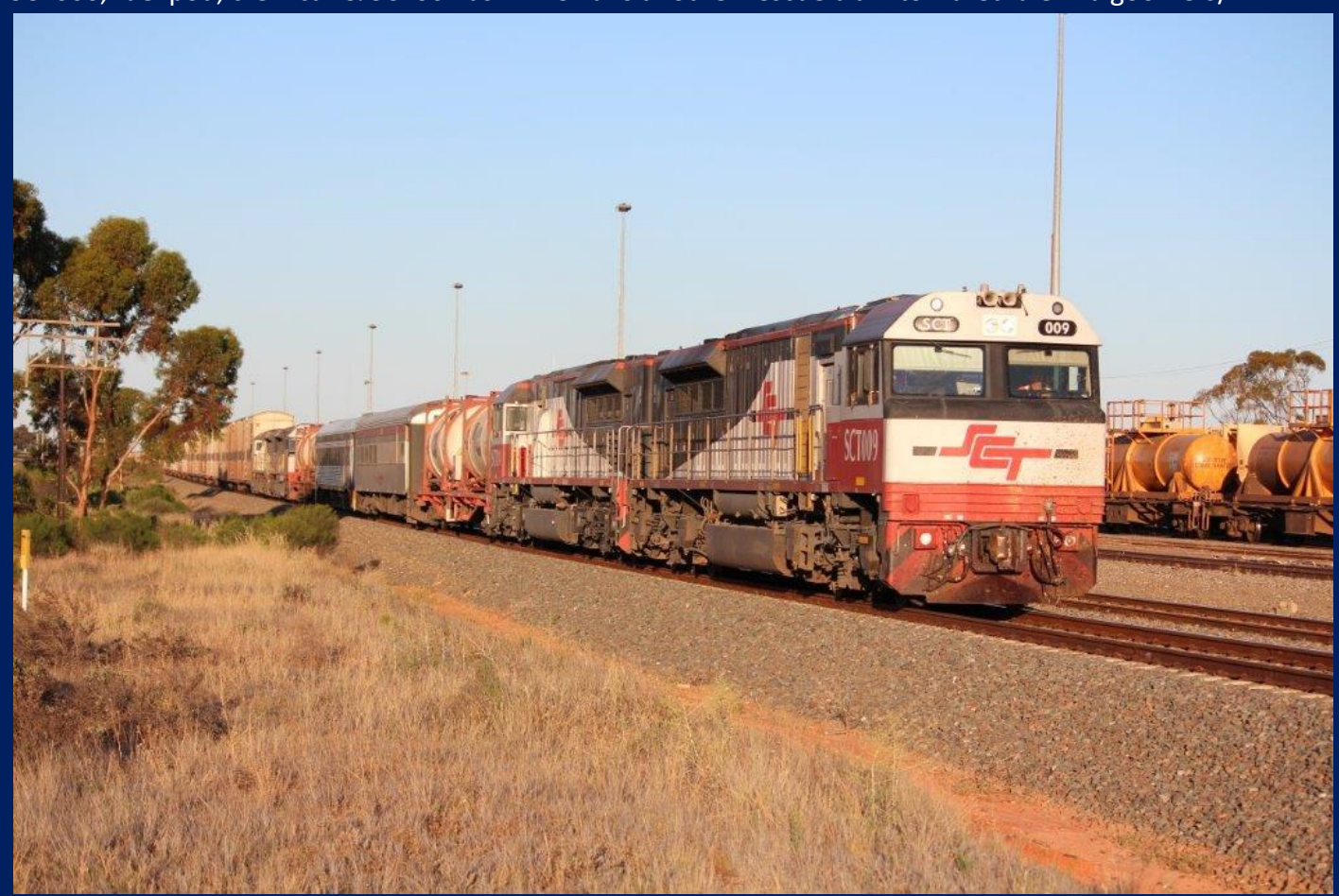
SCT009, SCT014, fuel pod, 2xcrew cars, fuel pod, dead attached SCT010 & SCT003 on 3MP9 in a set up not allowed by Brookfield operating rules entering West Kalgoorlie 10/12.