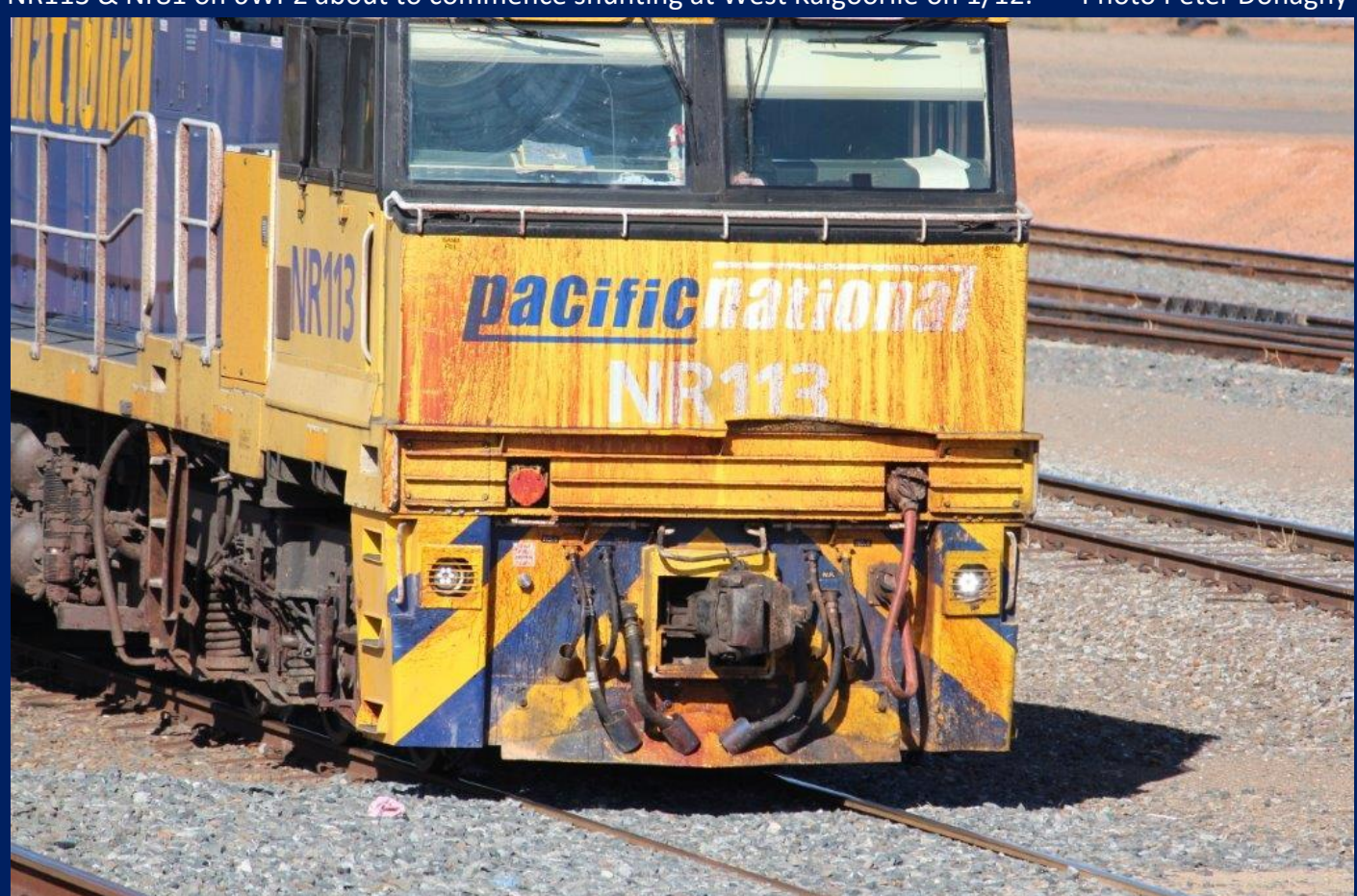
Close up of damage to NR113 after hitting a camel in desert east of Kalgoorlie 1/12.