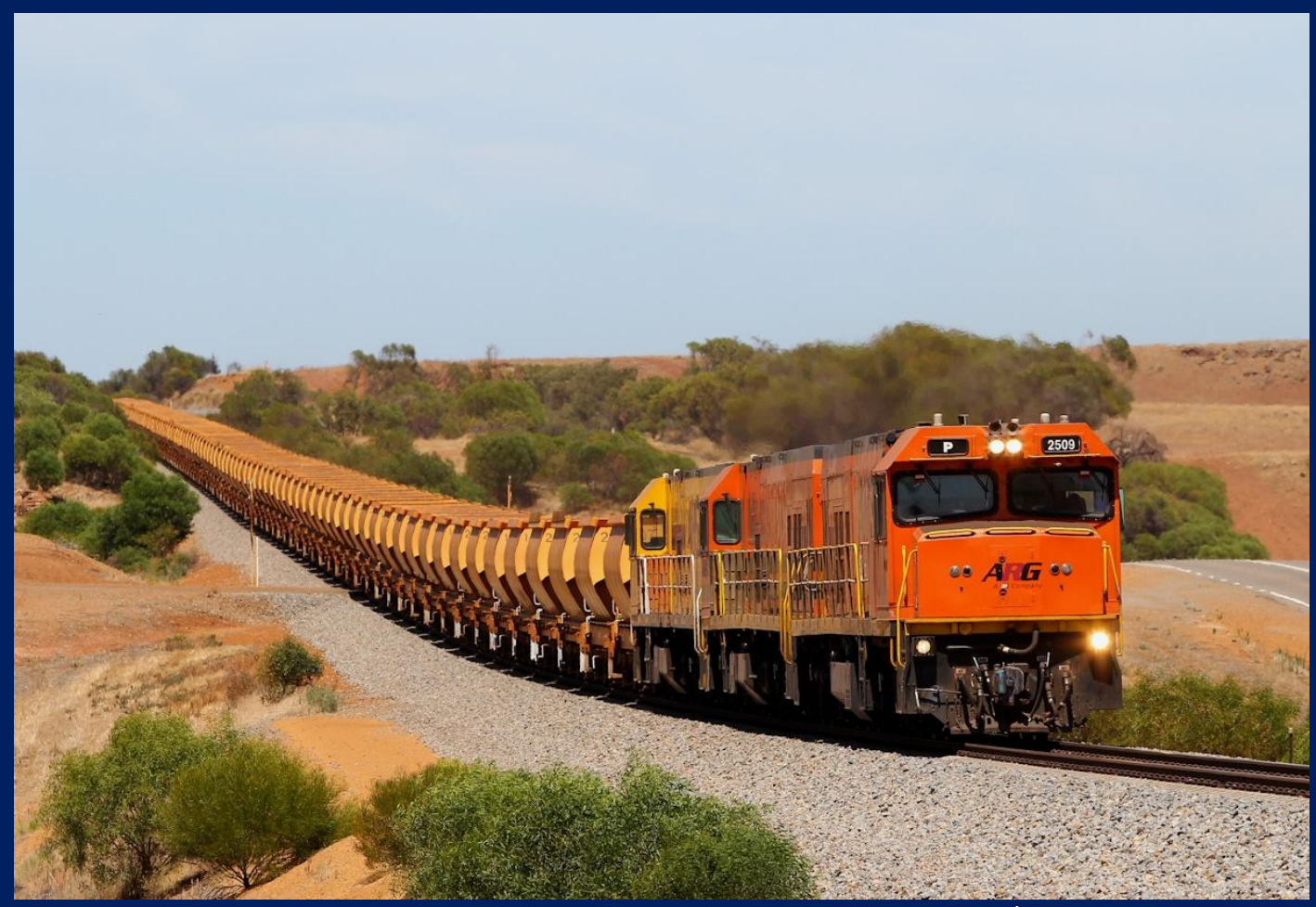
P2509, P2506 & P2502 on 5720 empty ore to Perenjori climbing towards Bringo 31/12.