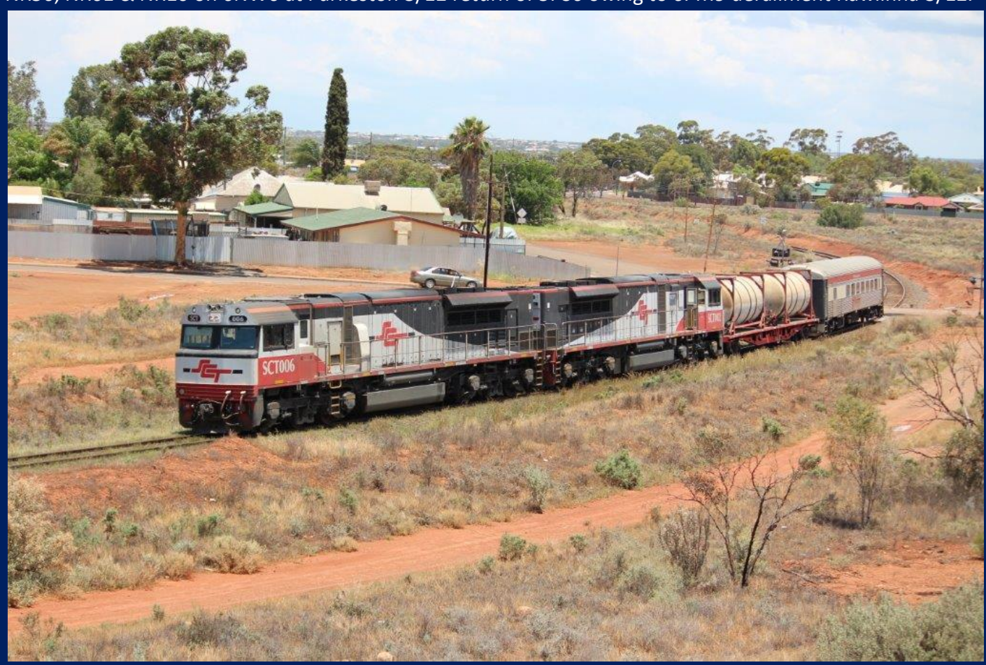
SCT006 & SCT002 on 6PM9 relief departing Kalgoorlie on December 5th to pick up track gang at Parkeston to ride in crew car, then shunt west end 5MP9 derailment site near Rawlinna.