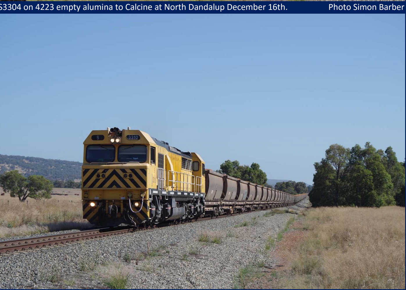
S3310 on 4944 bauxite Calcine to Kwinana at North Dandalup December 16th.