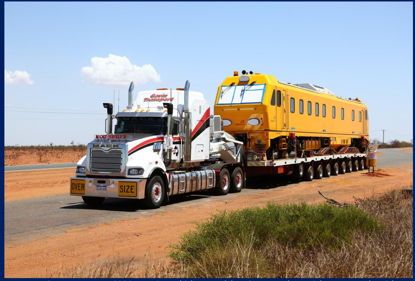
New BHPBIO Mermac Roger 800 inspection vehicle at truck bay Great Northern Highway December 6th.