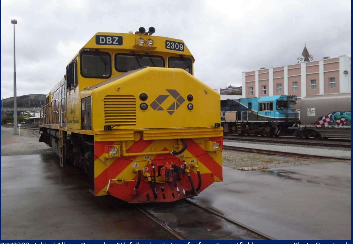
DBZ2309 stabled Albany December 5th following its transfer from Forrestfield.