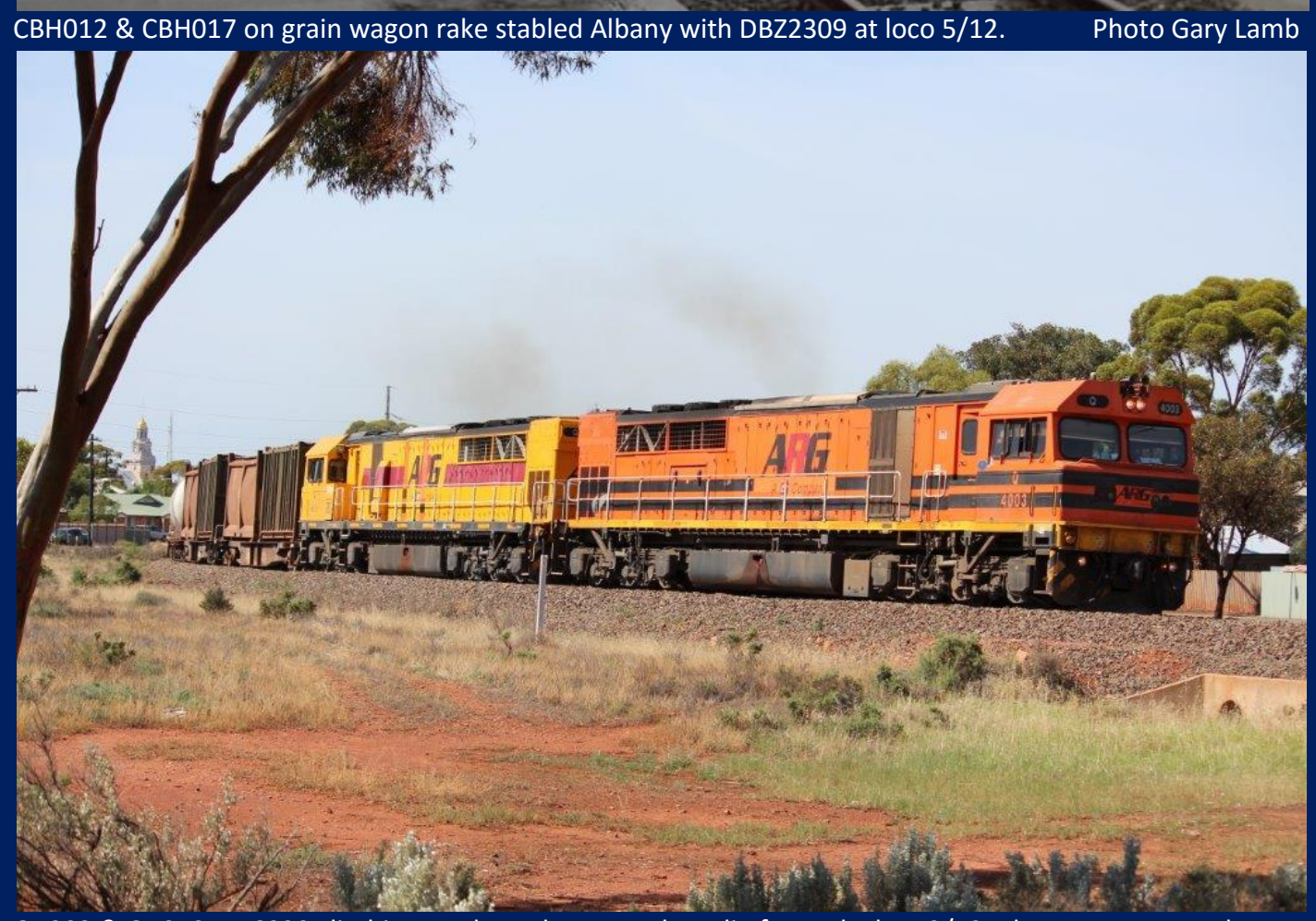
Q4003 & Q4012 on 6029 climbing grade as departs Kalgoorlie for Malcolm 12/12.