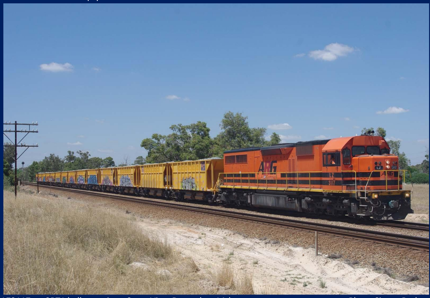
LZ3117 on 2BT1 ballast train at Swan View December 14th.