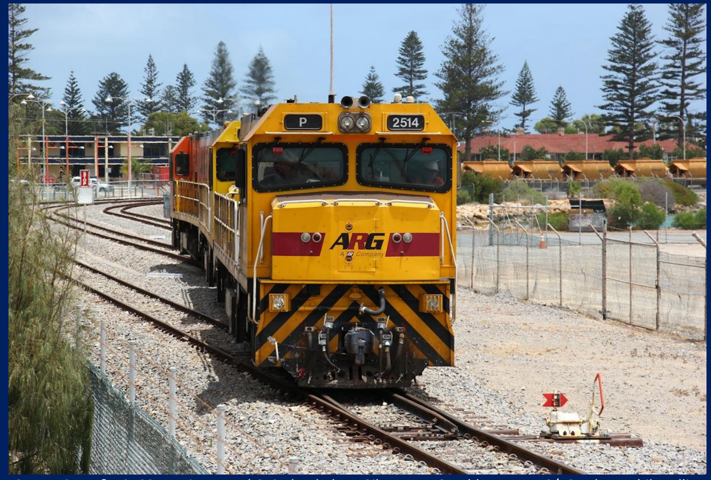
P2514, P2517 & P2509 running round 6721 loaded Mt Gibson ore Geraldton Port 18/12.