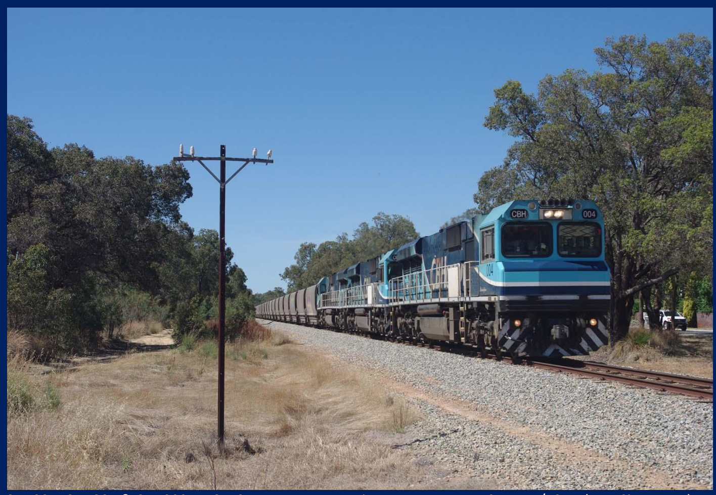
CBH004, CBH001 & CBH009 on 6K53 empty Watco grain Moora at Upper Swan11/12.