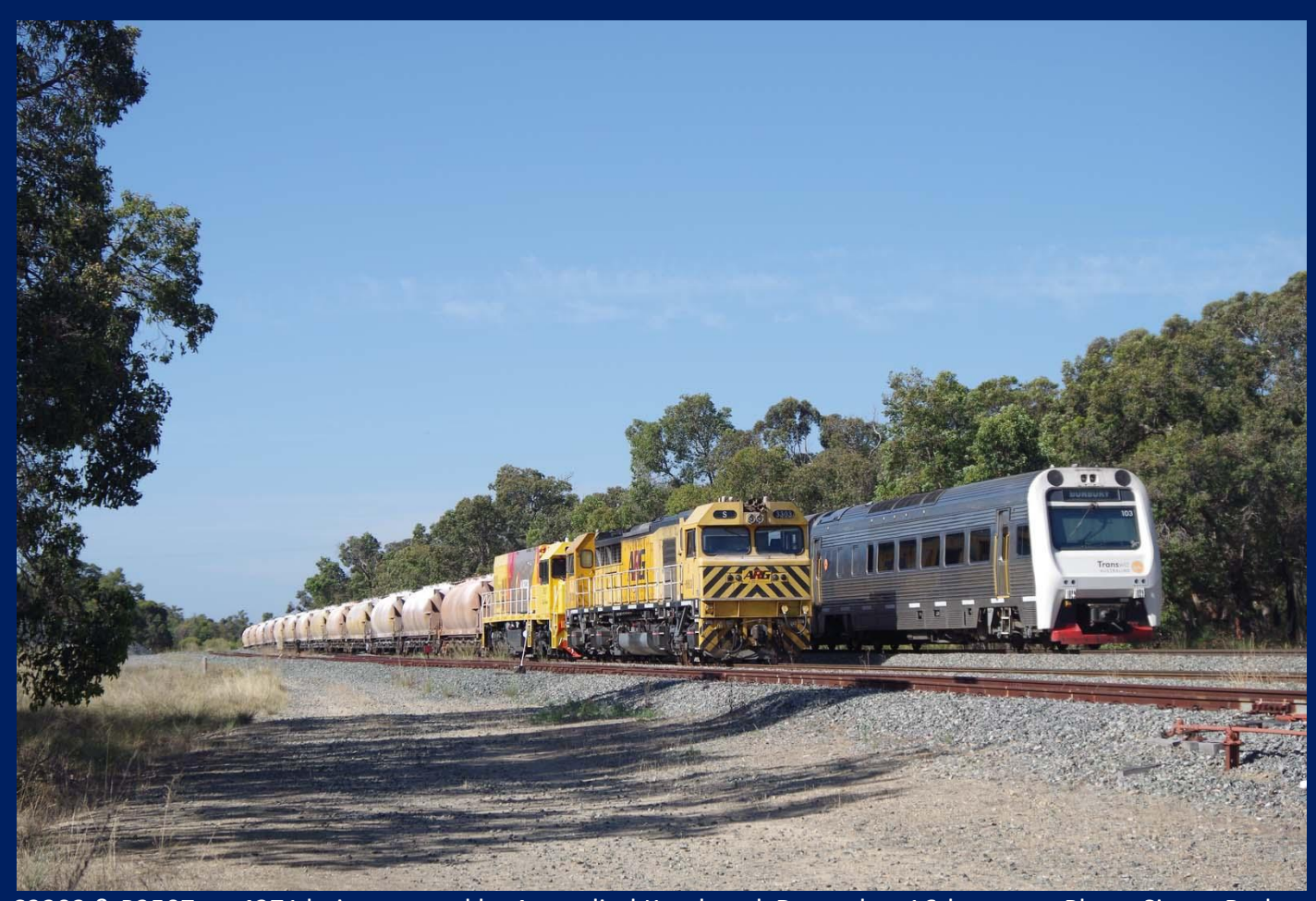
S3303 & P2507 on 4271 being crossed by Australind Keysbrook December 16th.