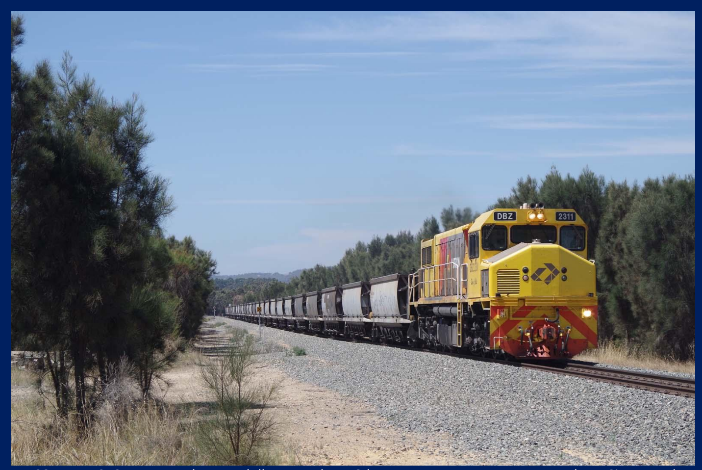
DBZ2311 on 4253 empty coal at Mardella December 16th.