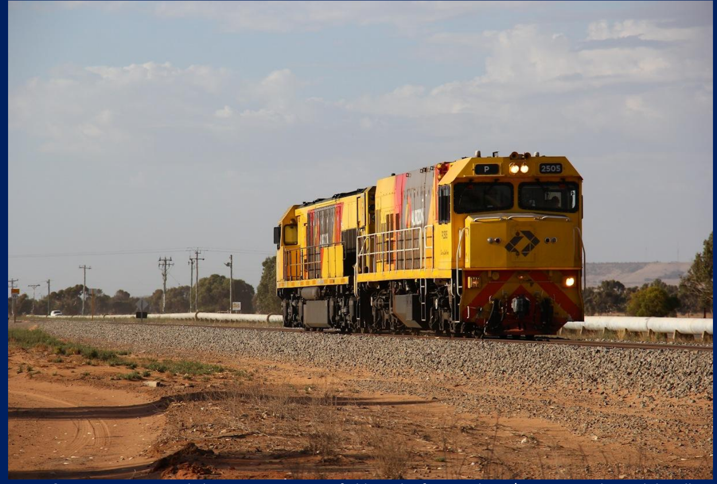
P2505 & ACN4170 on 2754 light engines to Forrestfield south of Narngulu 21/12.