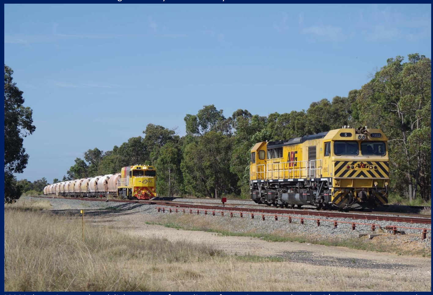
S3303 departing Keysbrook light engine after splitting from 4271 at Keysbrook 16/12.