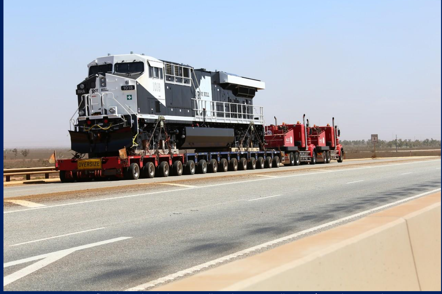
RHA1018 on transport float being hauled to Roy Hill Yard at Port Hedland 30/12.