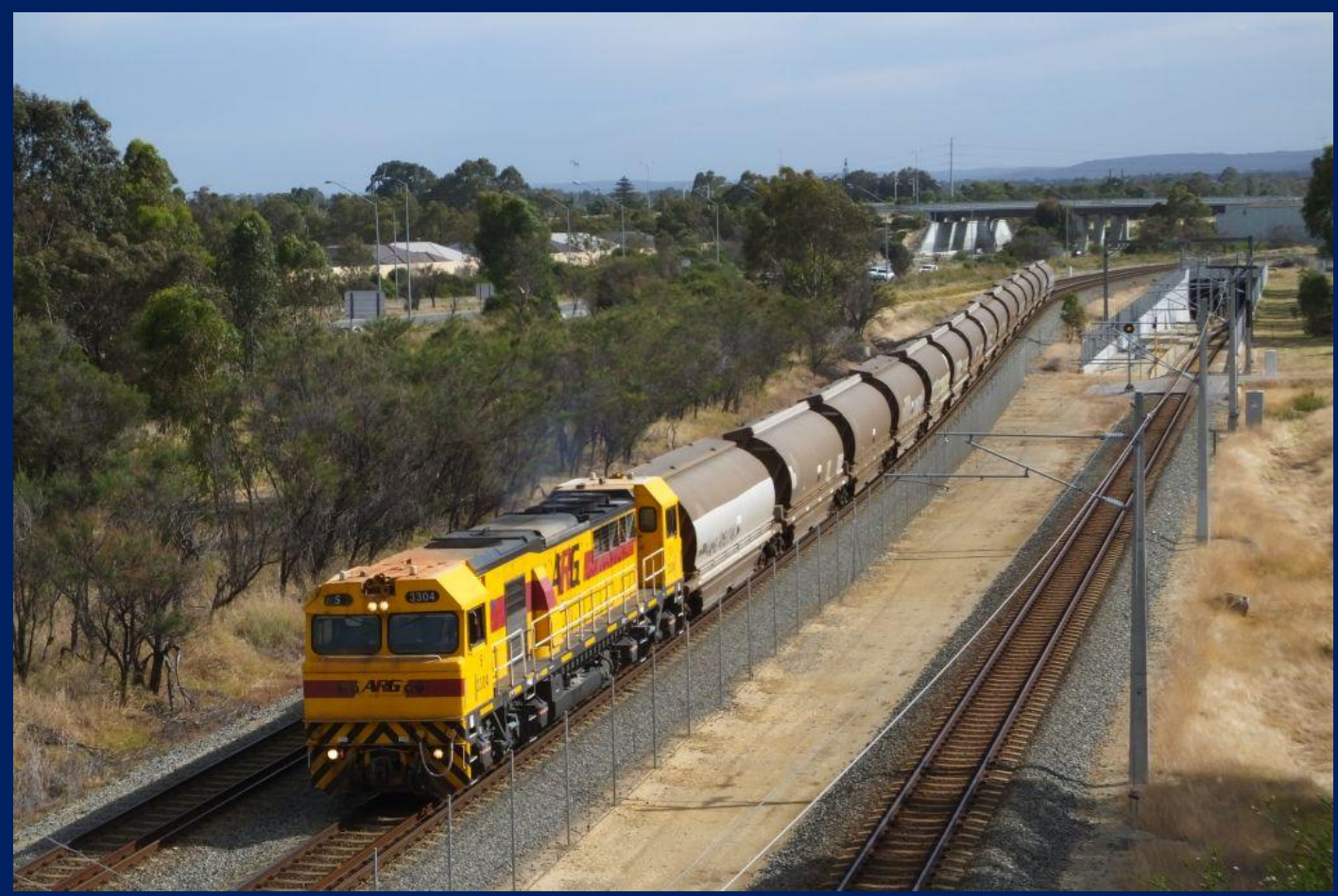
S3304 on 1222 empty XT wagon transfer Forrestfield Kwinana at Kenwick 20/12.