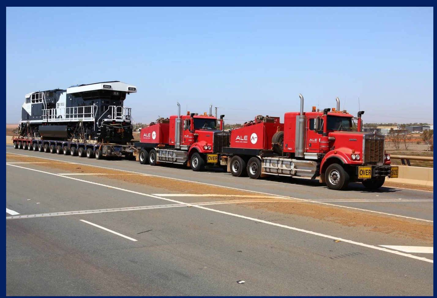
Roy Hill RHA1018 being hauled over new bypass road at Port Hedland 30/12.