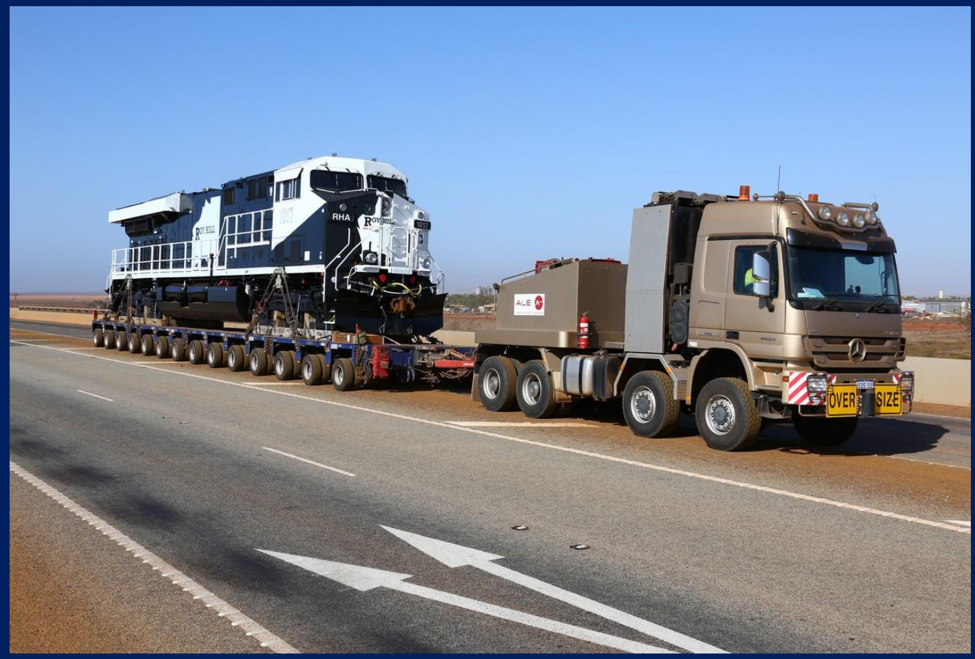
RHA1017 on transport float on bypass road Port Hedland December 30th.