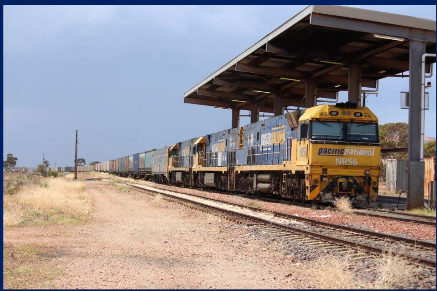
NR56, NR61 & NR10 on 6NW6 at Parkeston 5/12 return of 5PS6 owing to 6PM9 derailment Rawlinna 3/12.