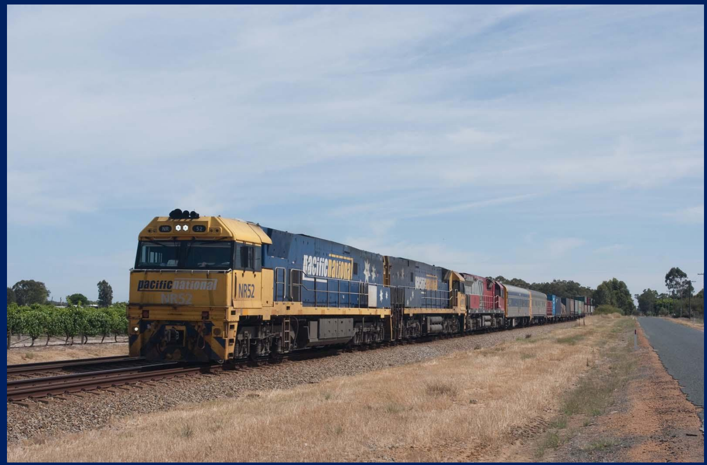
NR52, NR10 & MRL005 on 1MP5 intermodal returning MRL locomotive December 2nd.