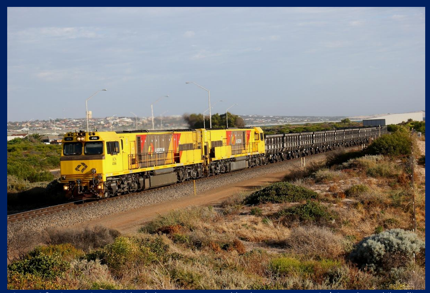
ACN4146 & ACN41459 on 2763 loaded Karara ore at Beachlands on way to port 21/12.