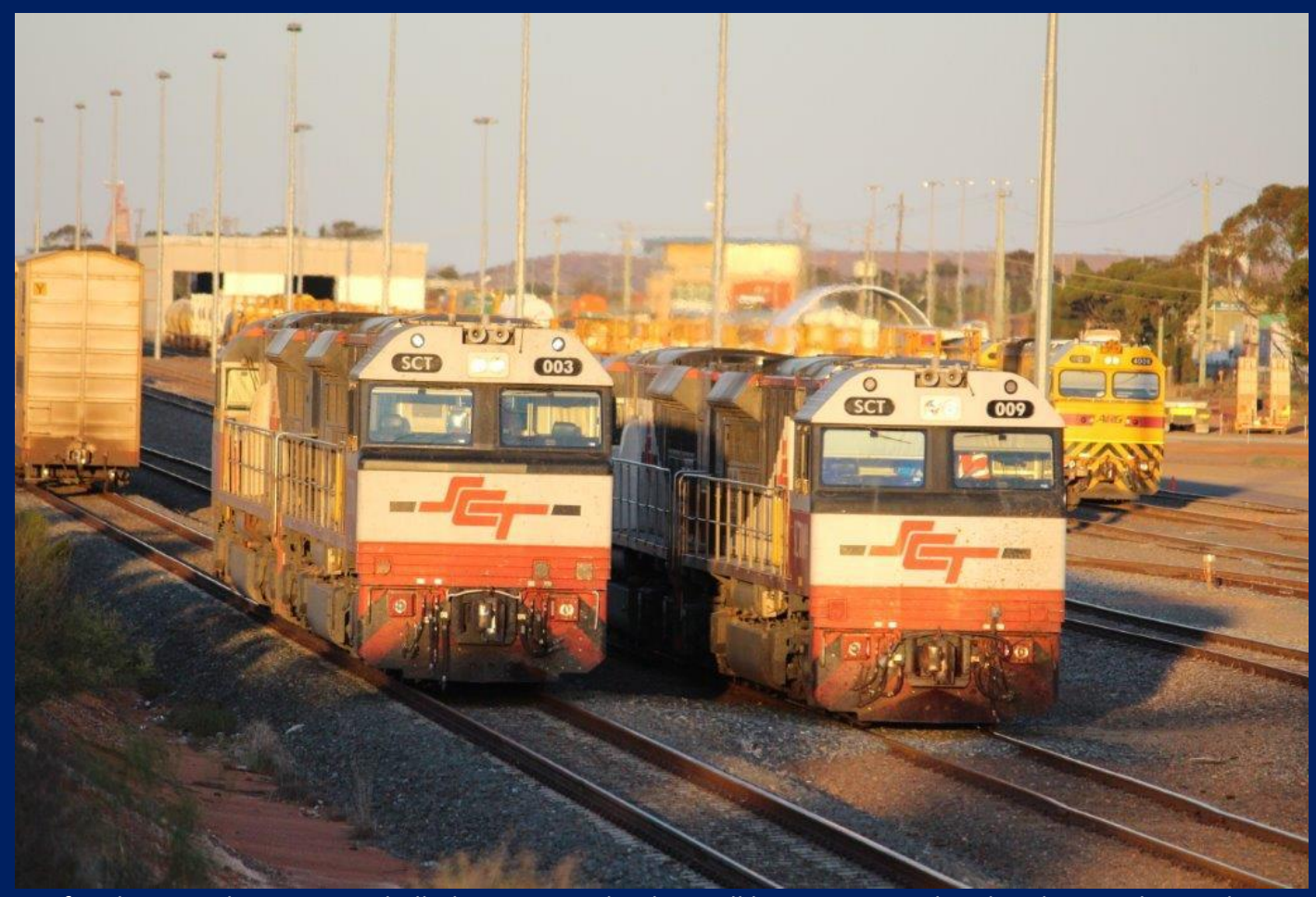
SCT freight 3MP9 being remarshalled at WEK yard to have all locomotives at head end December 10th.