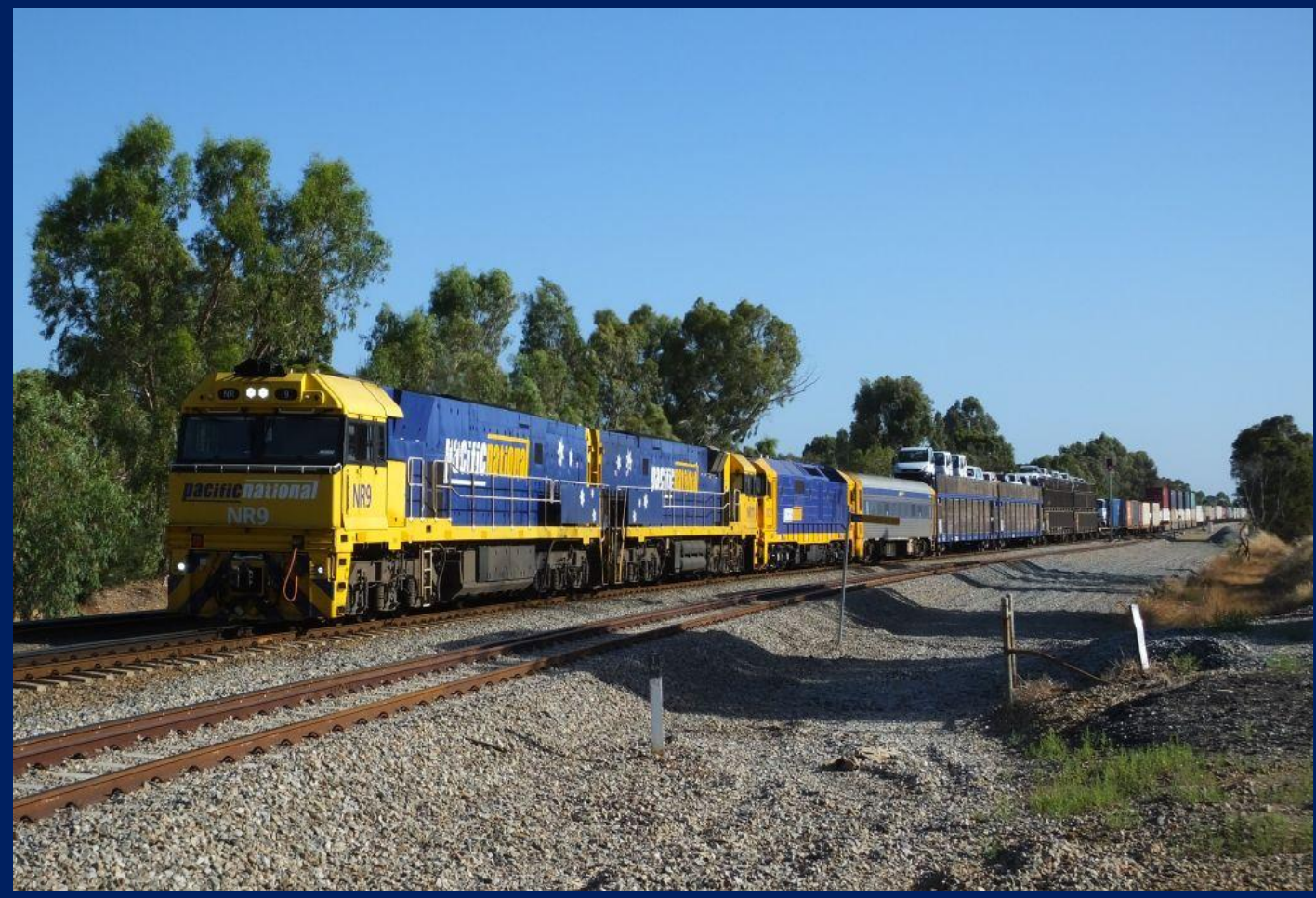
NR9, NR111 & dead attached 8121 on 5PM5 intermodal at Woodbridge December 24th.