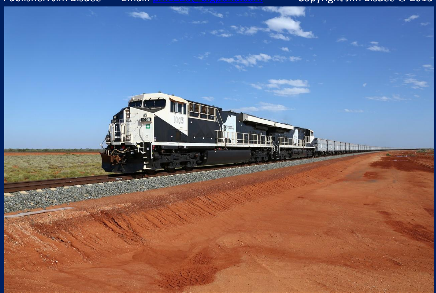
Roy Hill ES44ACi RHA1005 & RHA1004 on loaded half train at the 47.4km crossing with FMG line in the background December 3rd. Photo Toad Montgomery

Publisher: Jim Bisdee Email: <a href="mailto:pm1225@bigpond.com">pm1225@bigpond.com</a> Copyright Jim Bisdee © 2015