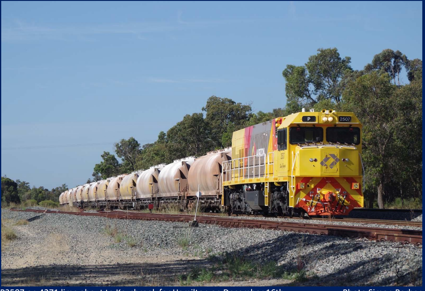
P2507 on 4271 lime about to Keysbrook for Hamilton on December 16th.