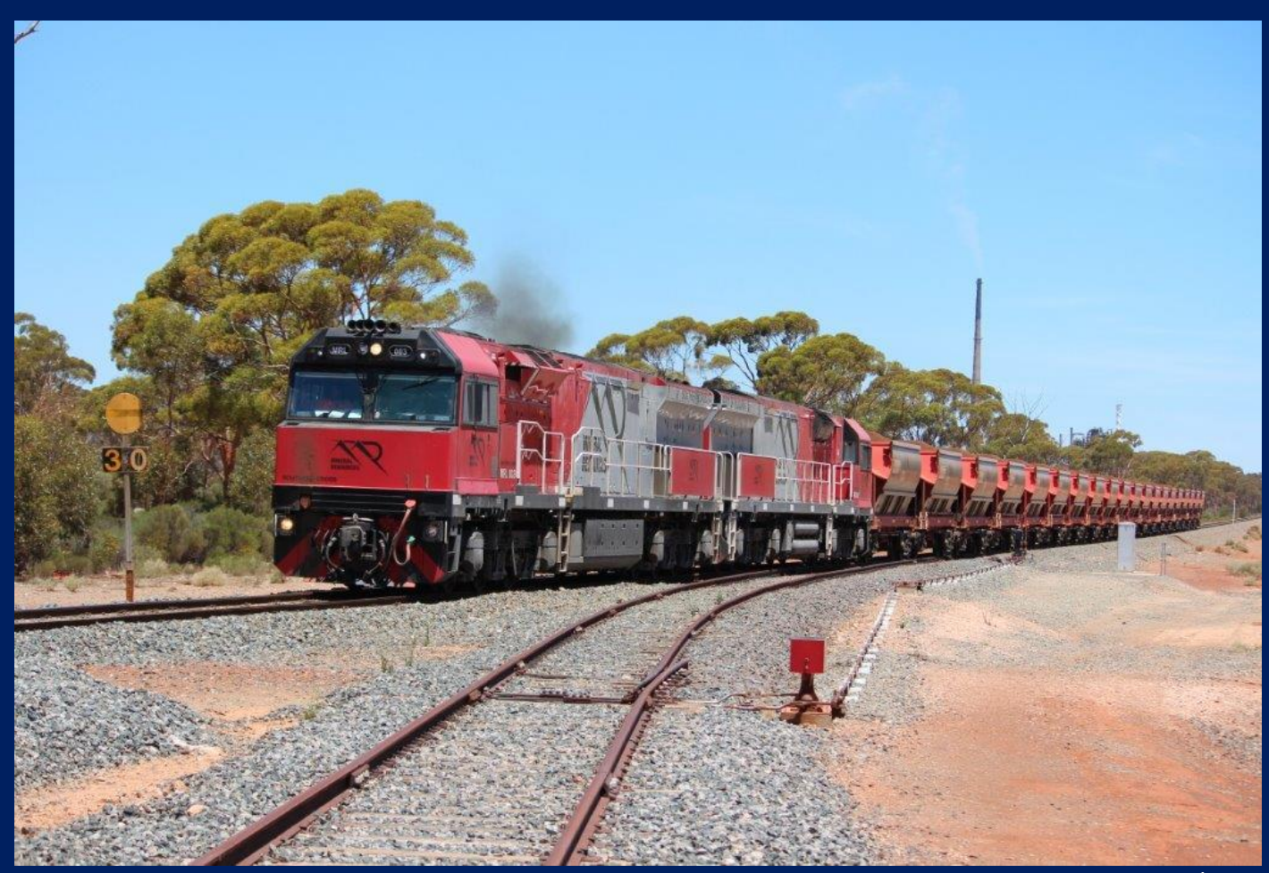
MRL003 & MRL002 on 6EK2 Mineral Resources short test train that ran Esperance return Hampton 18/12.