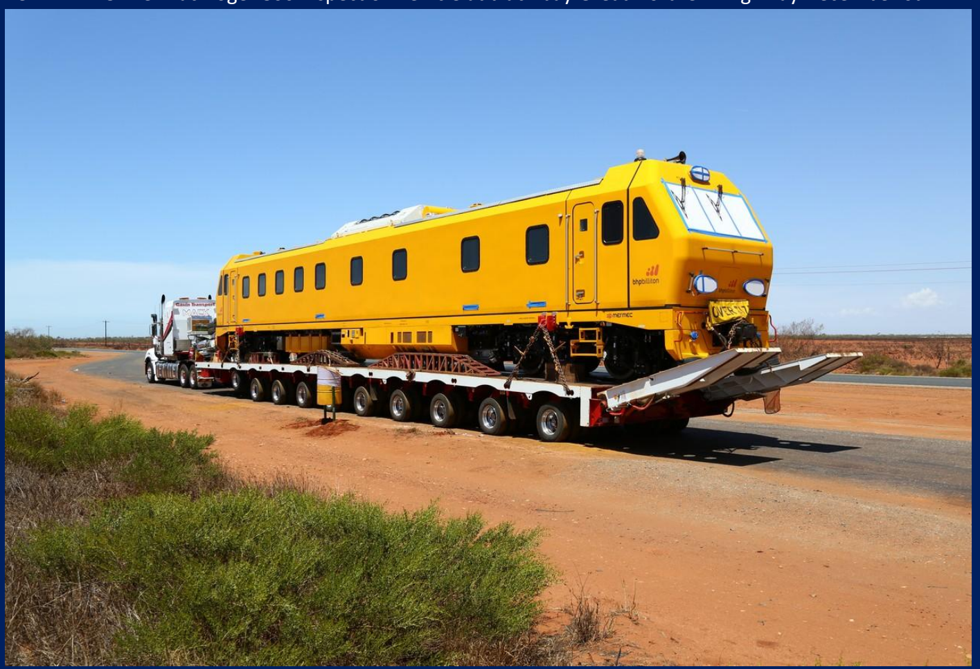
Mermac Roger 800 inspection vehicle at truck bay December 6th.