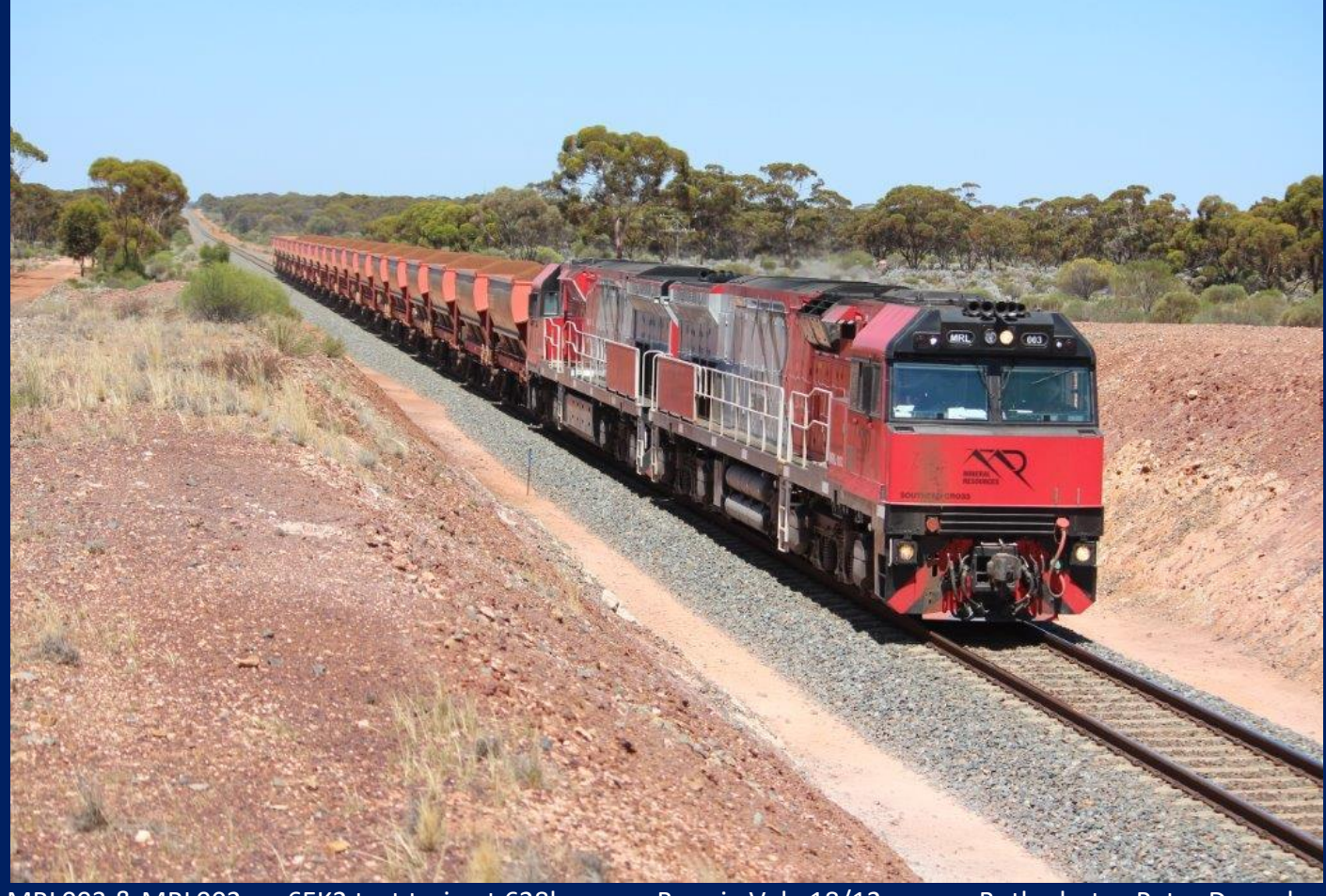
MRL003 & MRL002 on 6EK2 test train at 628km near Bonnie Vale 18/12.