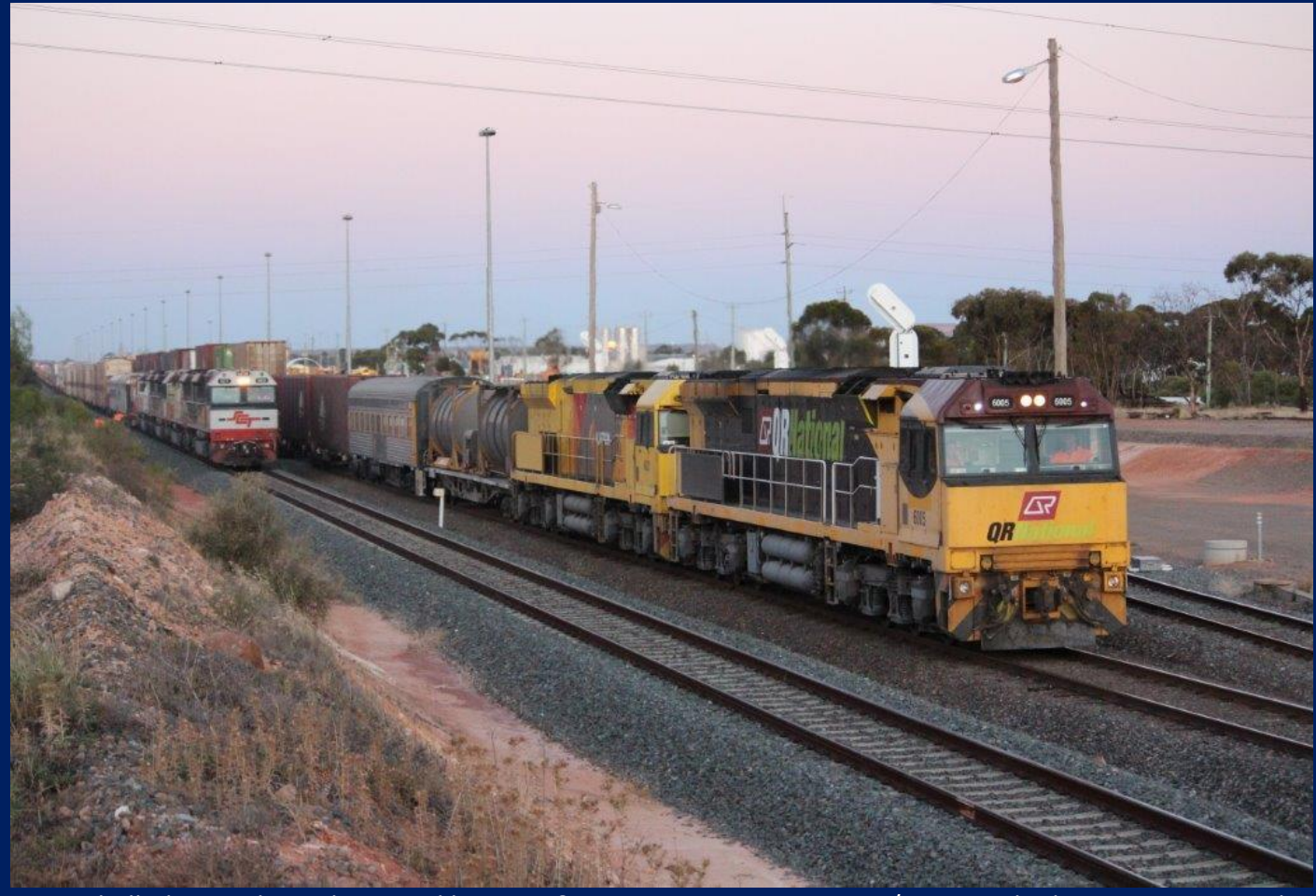
Remarshalled 3MP9 being bypassed by 6005 & 6025 on 3MP1 at WEK 10/12.