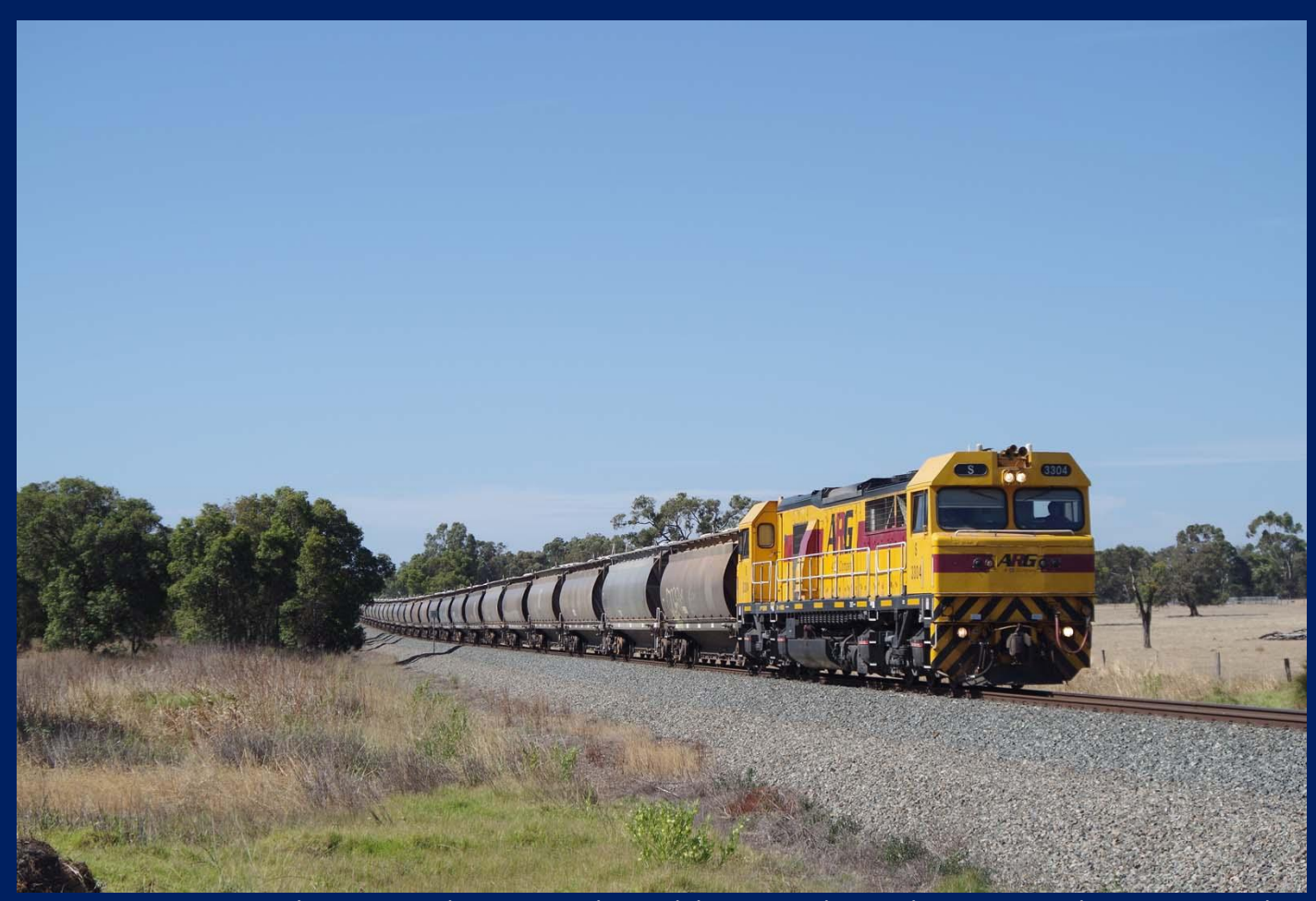
S3304 on 4223 empty alumina to Calcine at North Dandalup December 16th.