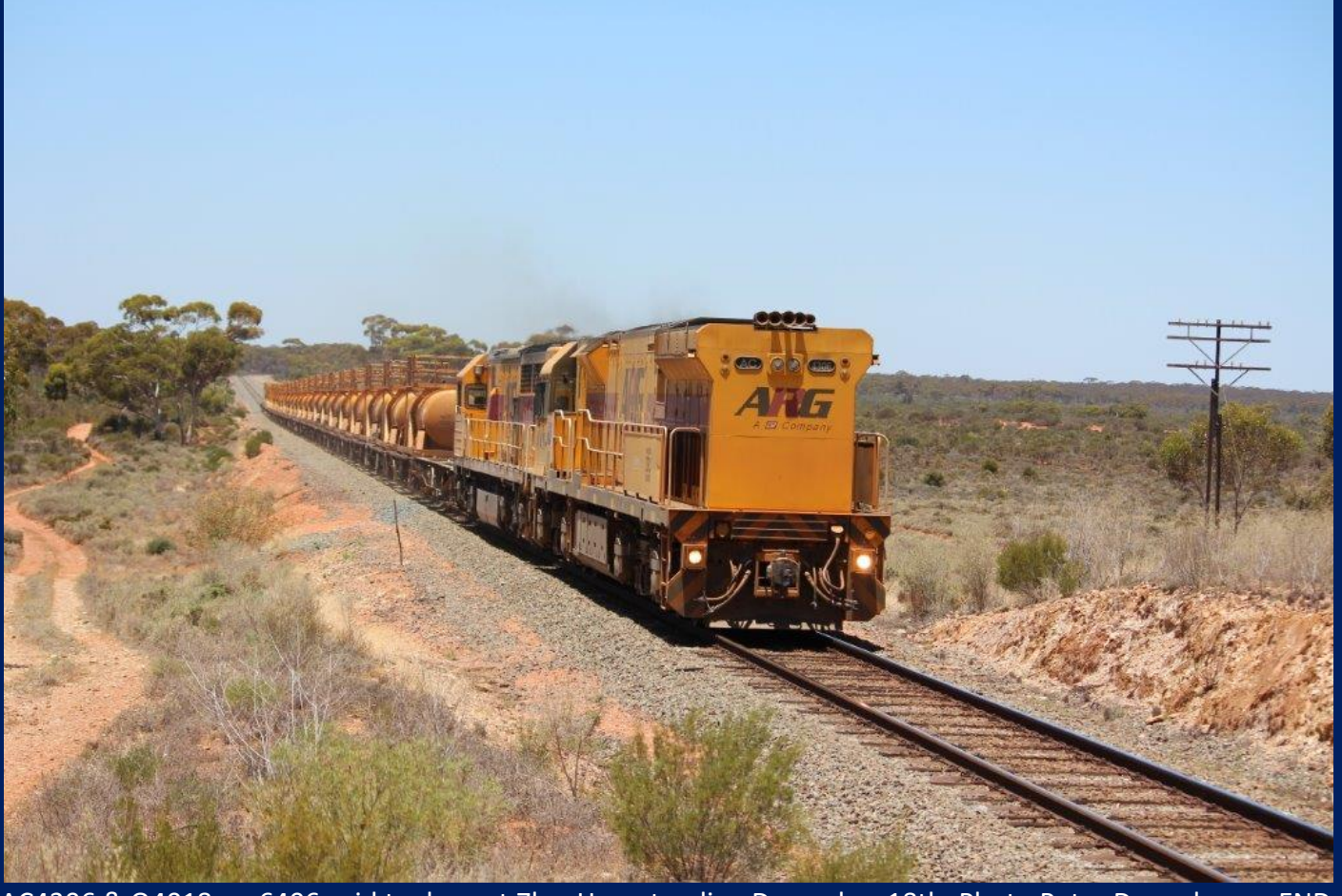
AC4306 & Q4018 on 6406 acid tankers at 7km Hampton line December 18th.