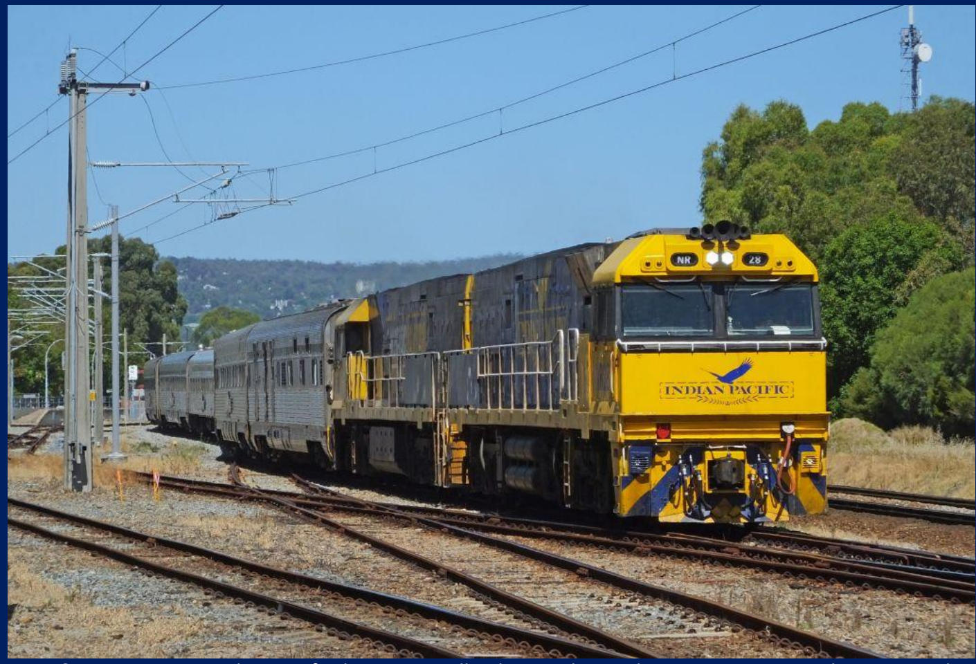
NR28 & NR58 on 5AP8 Indian Pacific departing Midland December 26th.