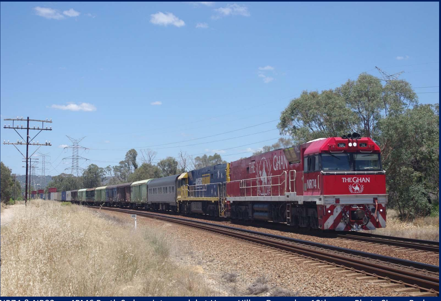
NR74 & NR92 on 4PM6 Perth Sydney intermodal at Herne Hill on December 10th.