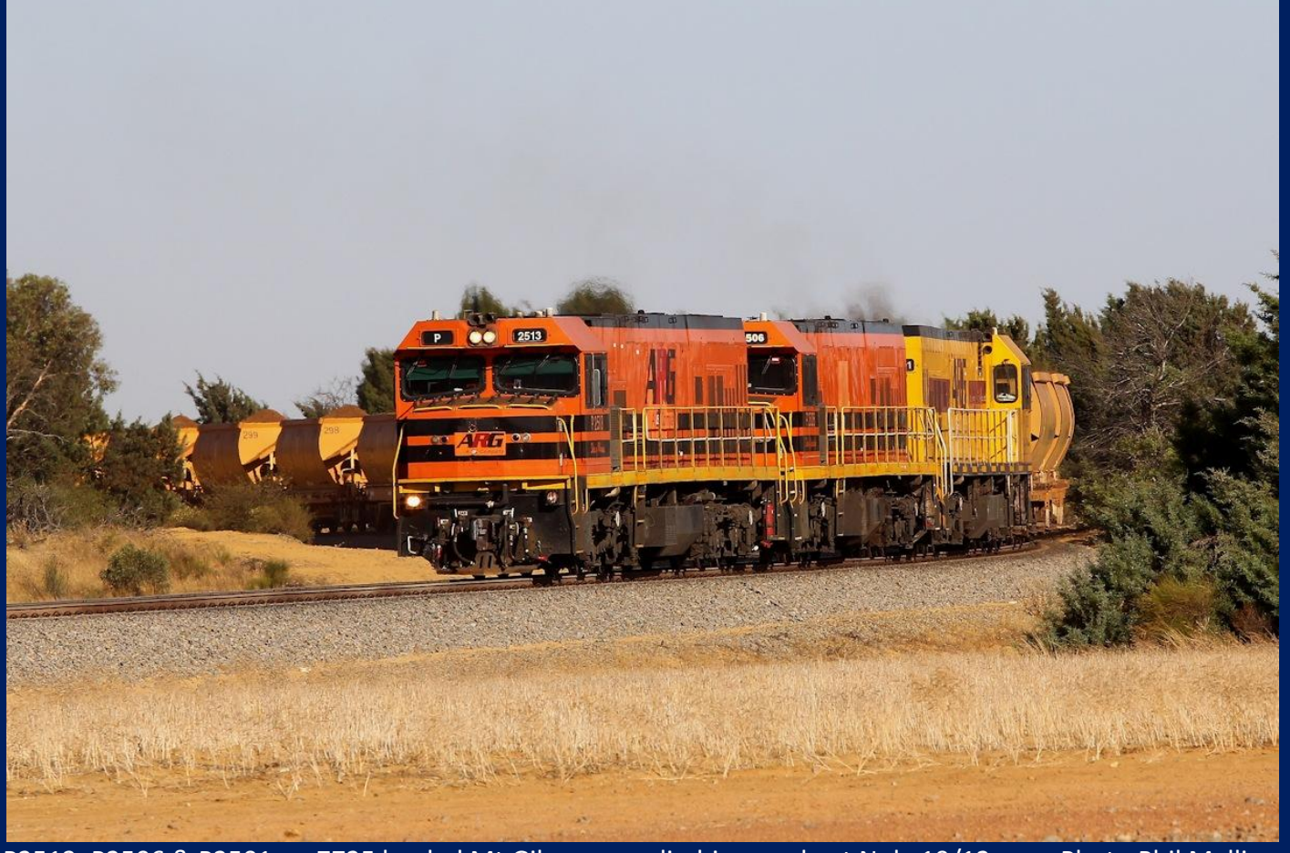
P2513, P2506 & P2501 on 7725 loaded Mt Gibson ore climbing grade at Nola 19/12.