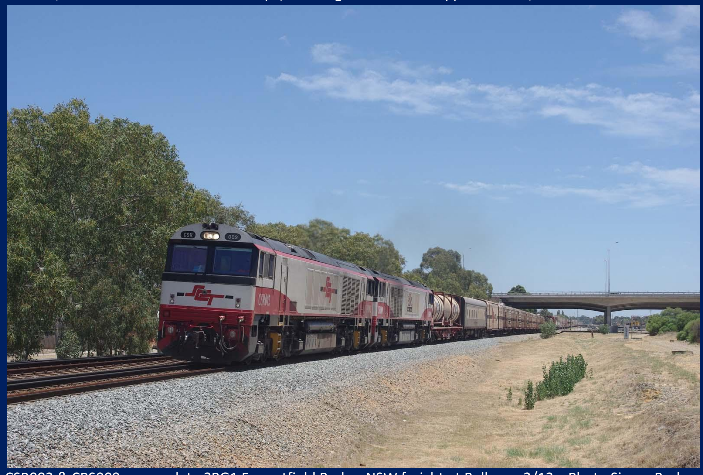
CSR002 & CRS009 on very late 3PG1 Forrestfield Parkes NSW freight at Bellevue 2/12.