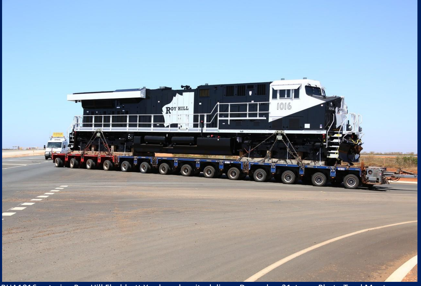
RHA1016 entering Roy Hill Flashbutt Yard road on its delivery December 31st.