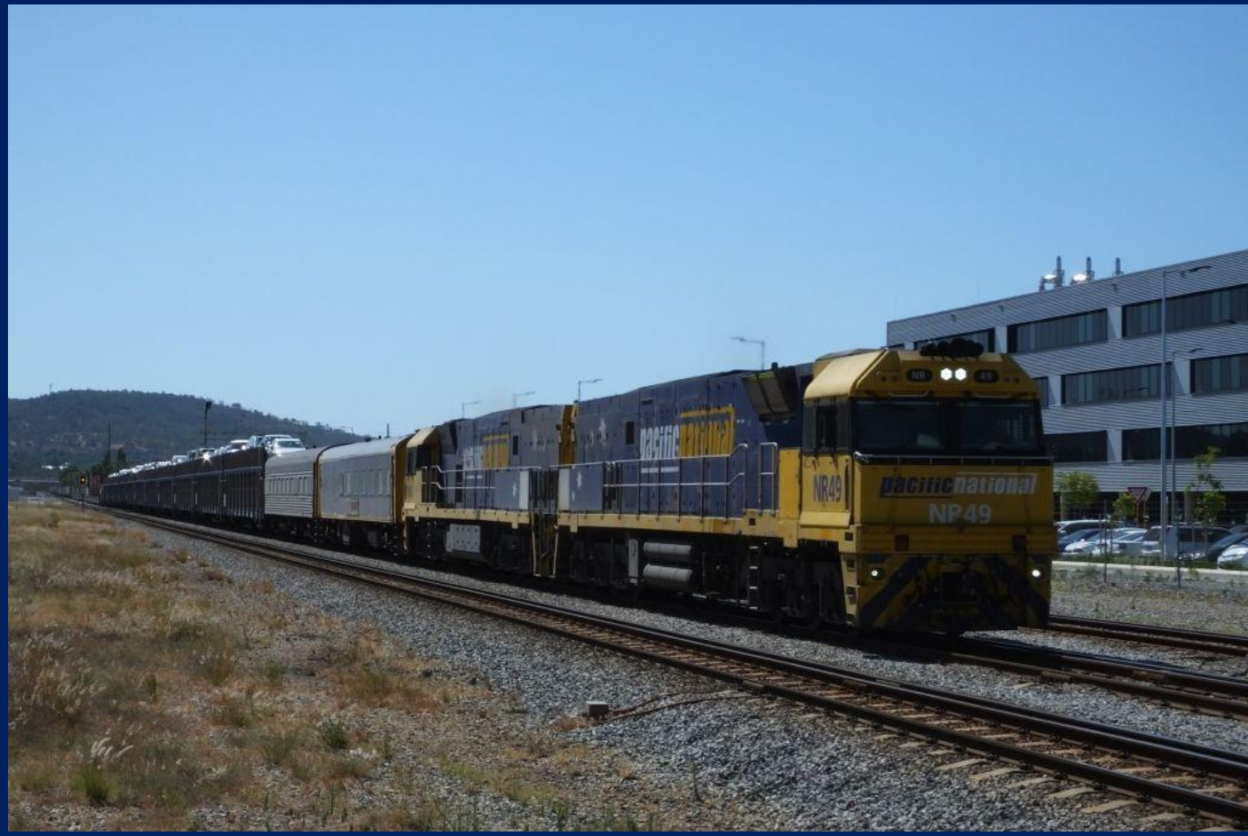
NR49 & NR43 on 1MP5 with two crew cars and 11 RMOY latest double deck car carriers Midland 23/12.