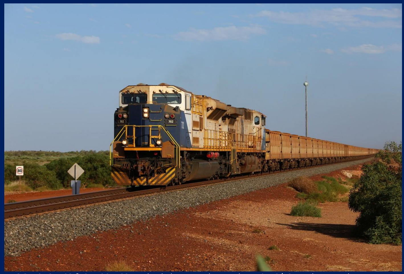
FMG SD70ACe 702 & C44-9CW 007 on loaded ore at Indee Road crossing 3/12.