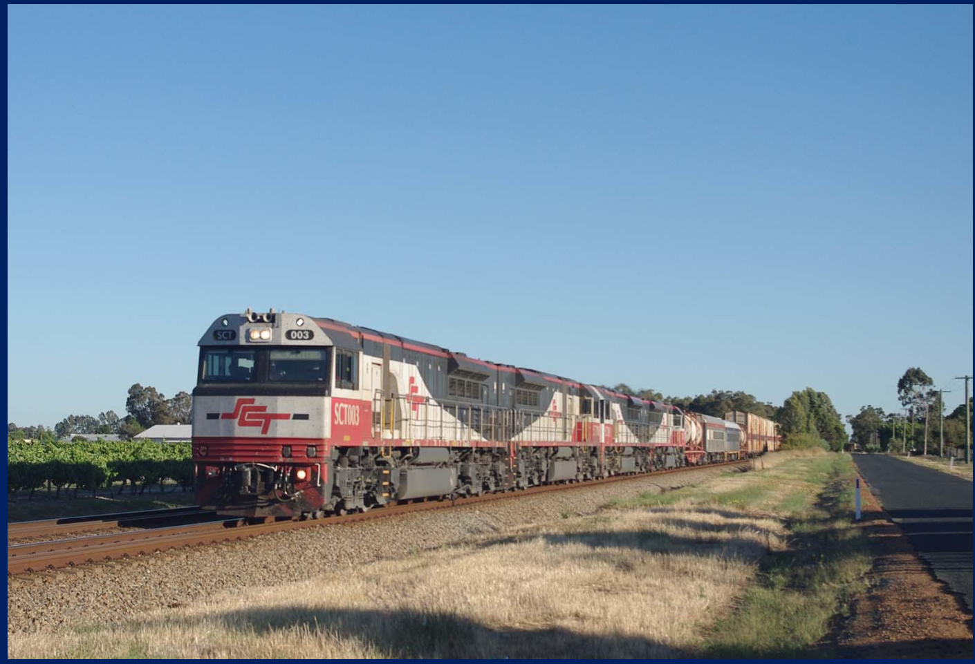
SCT003, SCT010, SCT009 & SCT014 on 3MP9 SCT freight 2x crew cars Herne Hill 11/12.