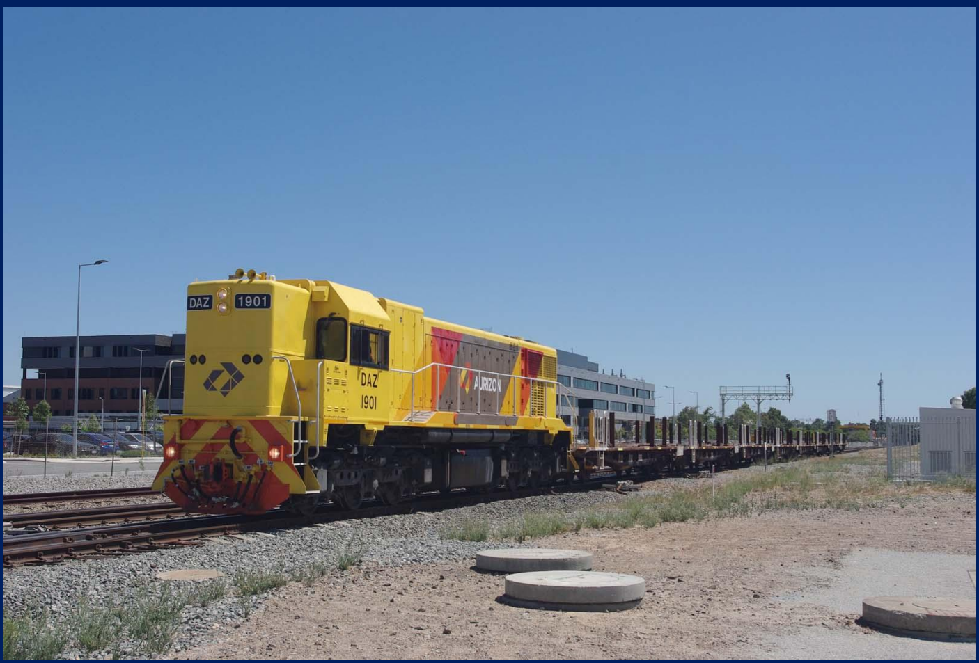
DAZ1901 on 6125 empty rail train crossing over to enter Flashbutt Yard on March 4th.