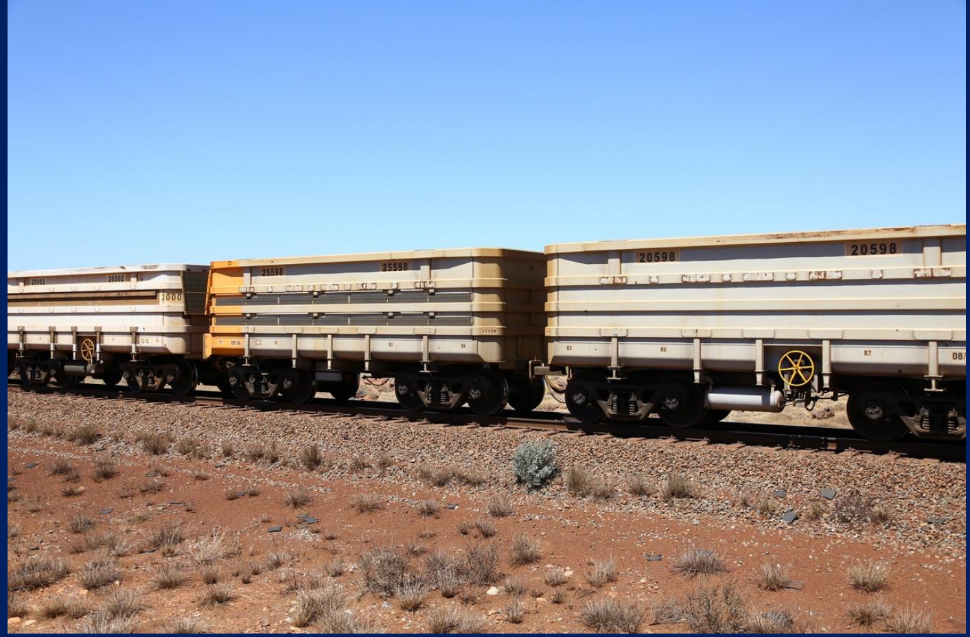
Bradken Chinese built new style Rio Tinto ore car 25598 as an instrument car 7/3.