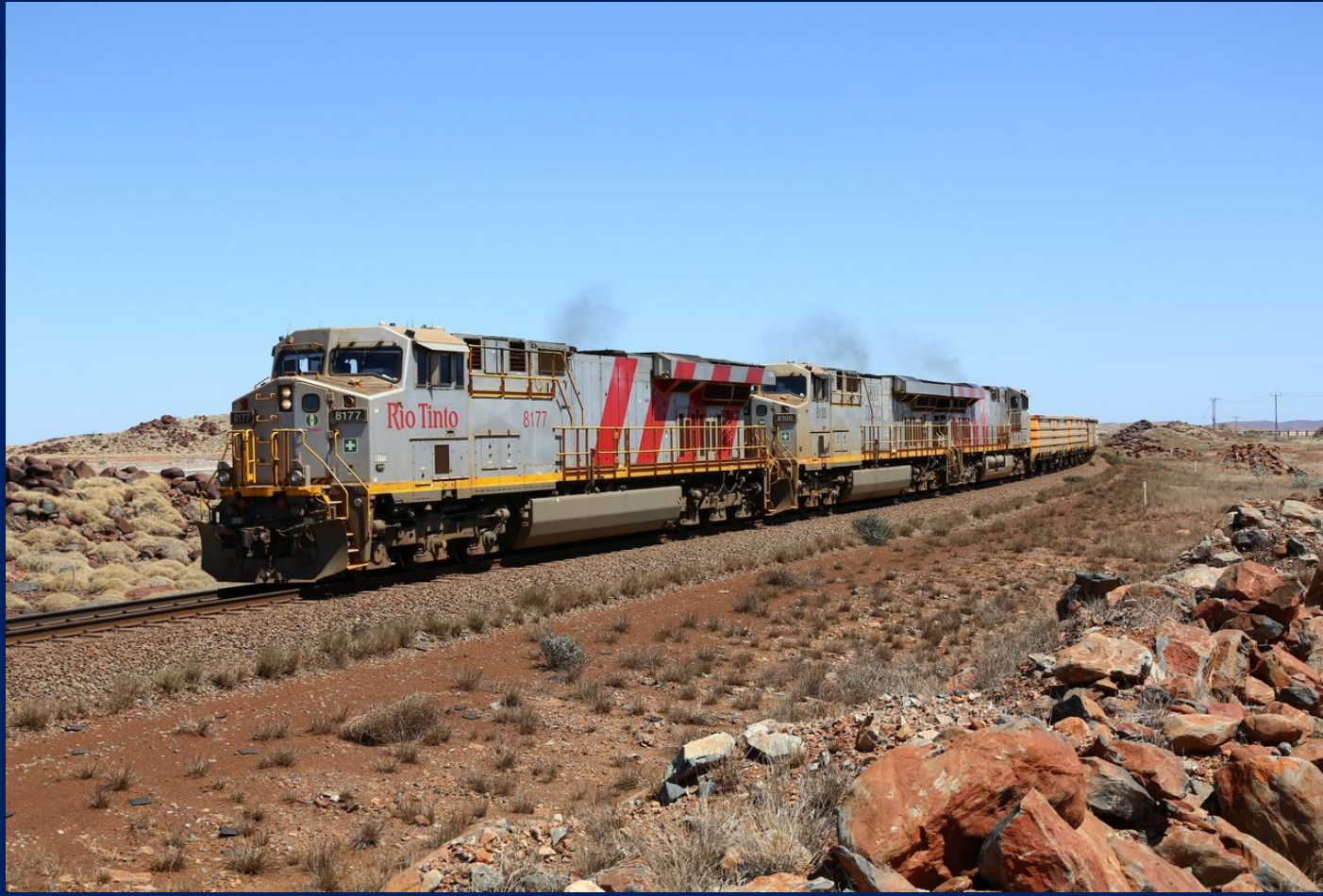
8177, 8100 & 8123 on empty ore at 34km single line section out of Dampier 7/3.