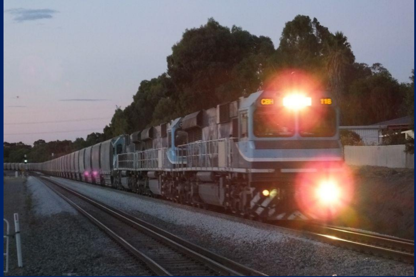
CBH118, CBH119 & CBH122 on 1S58 Watco grain after sunset at Hazelmere March 13th.