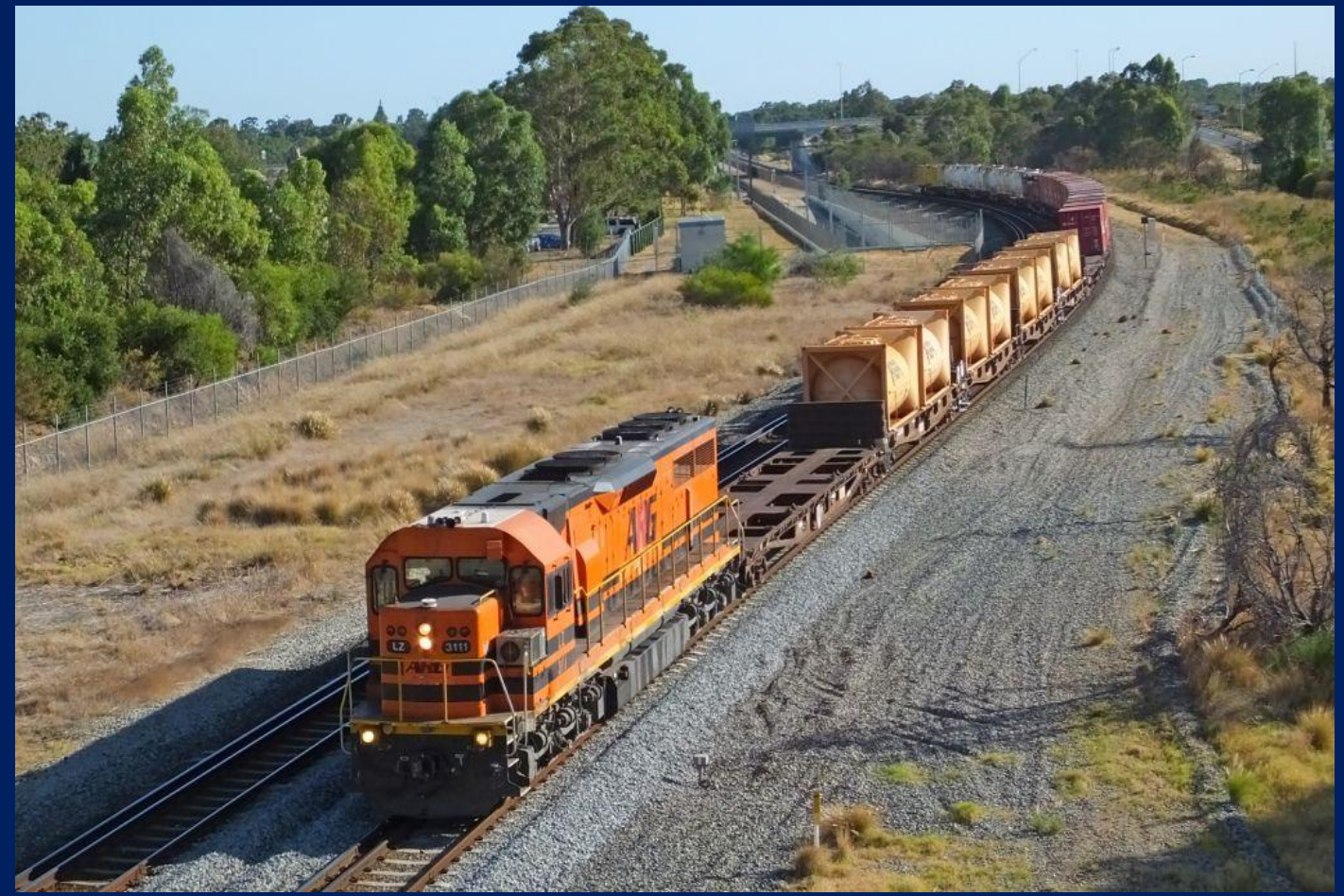
LZ3111 on rare mainline run with 7025 shunter Kwinana to Forrestfield at Kenwick 12/3.