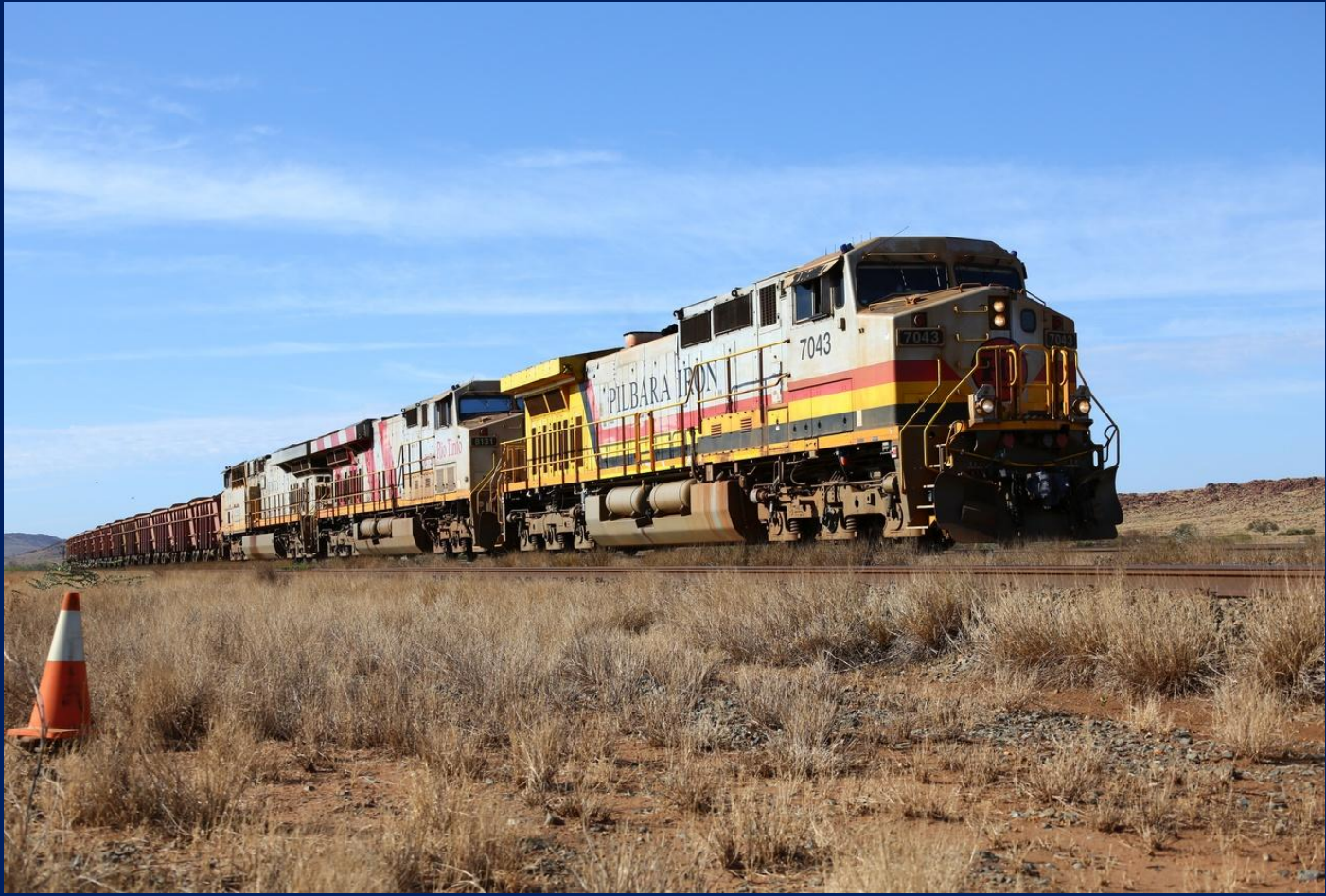
7043, 8131 & 8114 on loaded ore Dingo Siding note the auto haul sensors above the ditch lights March 5th.