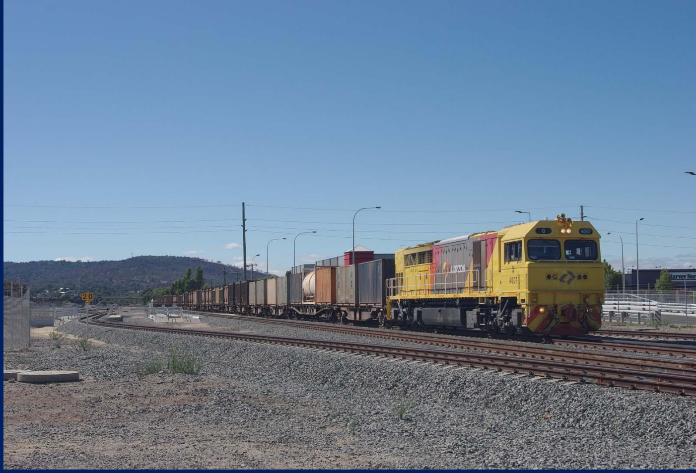
Q4007 on 6430 empty sulphur crossing Lloyd Street underpass Midland March 5th.