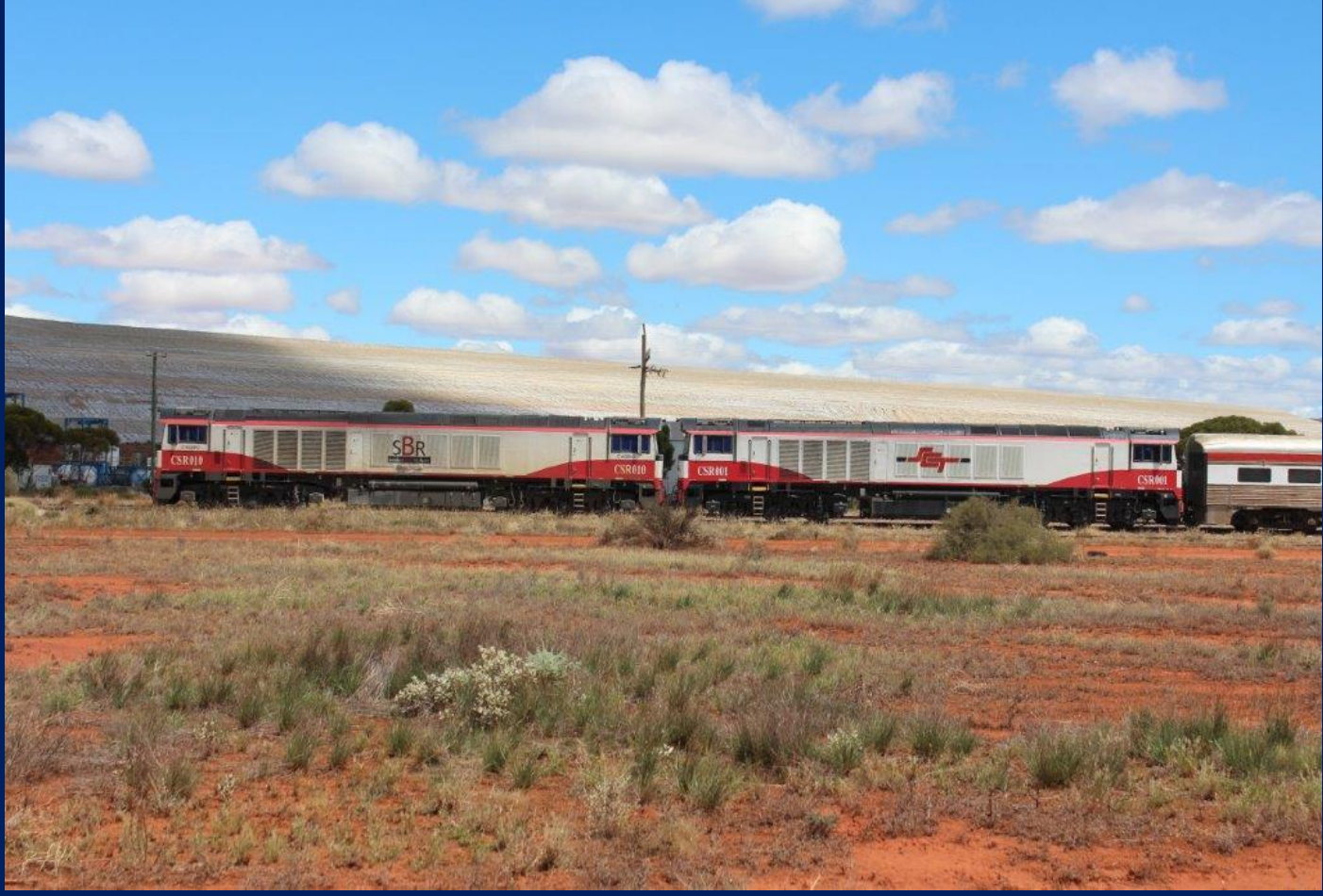
CSR010 & CSR001 stabled in Engineers siding Parkeston with 8M22 ballast train 6/3.