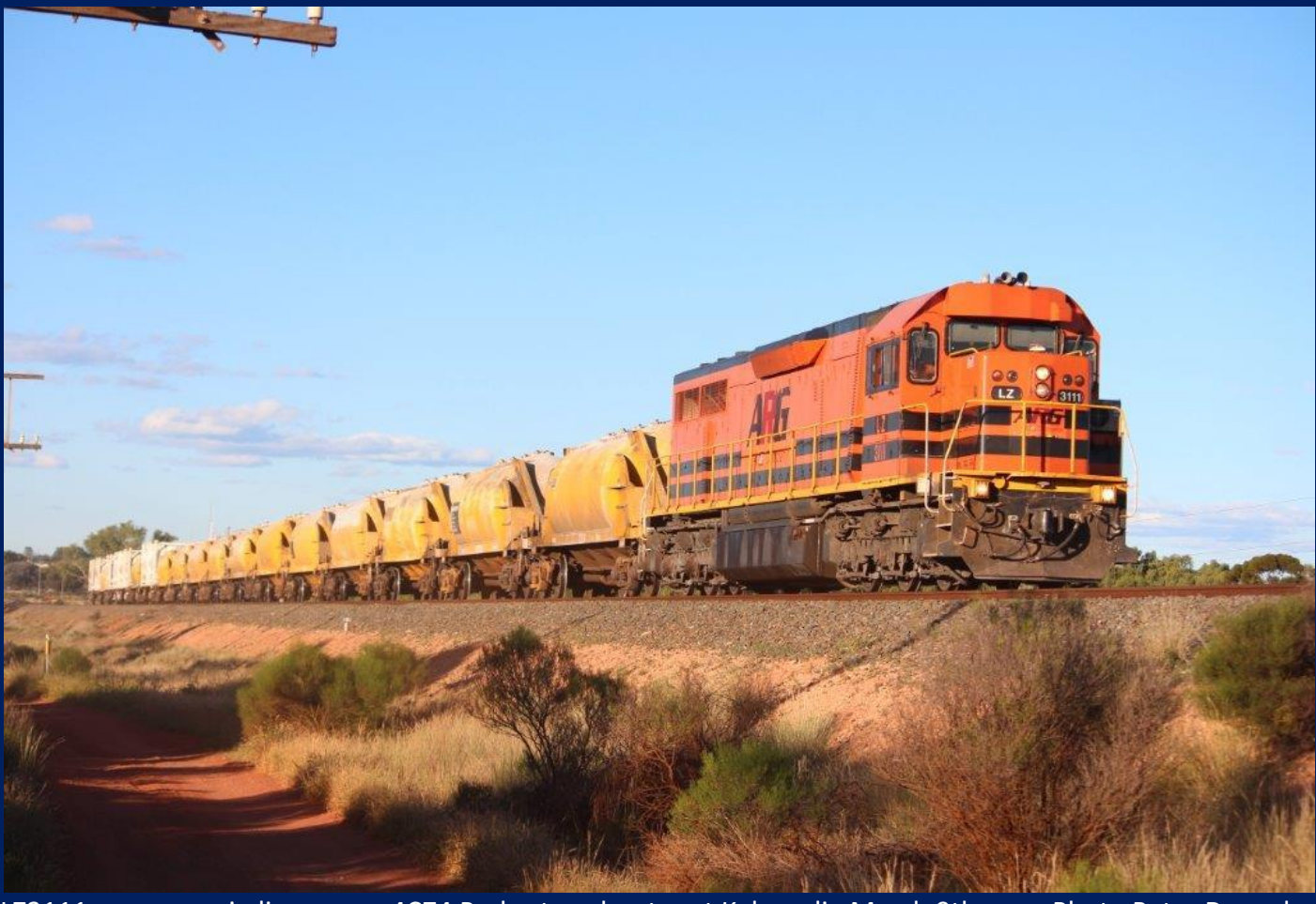
LZ3111 on rare main line run as 4C74 Parkeston shunter at Kalgoorlie March 9th.