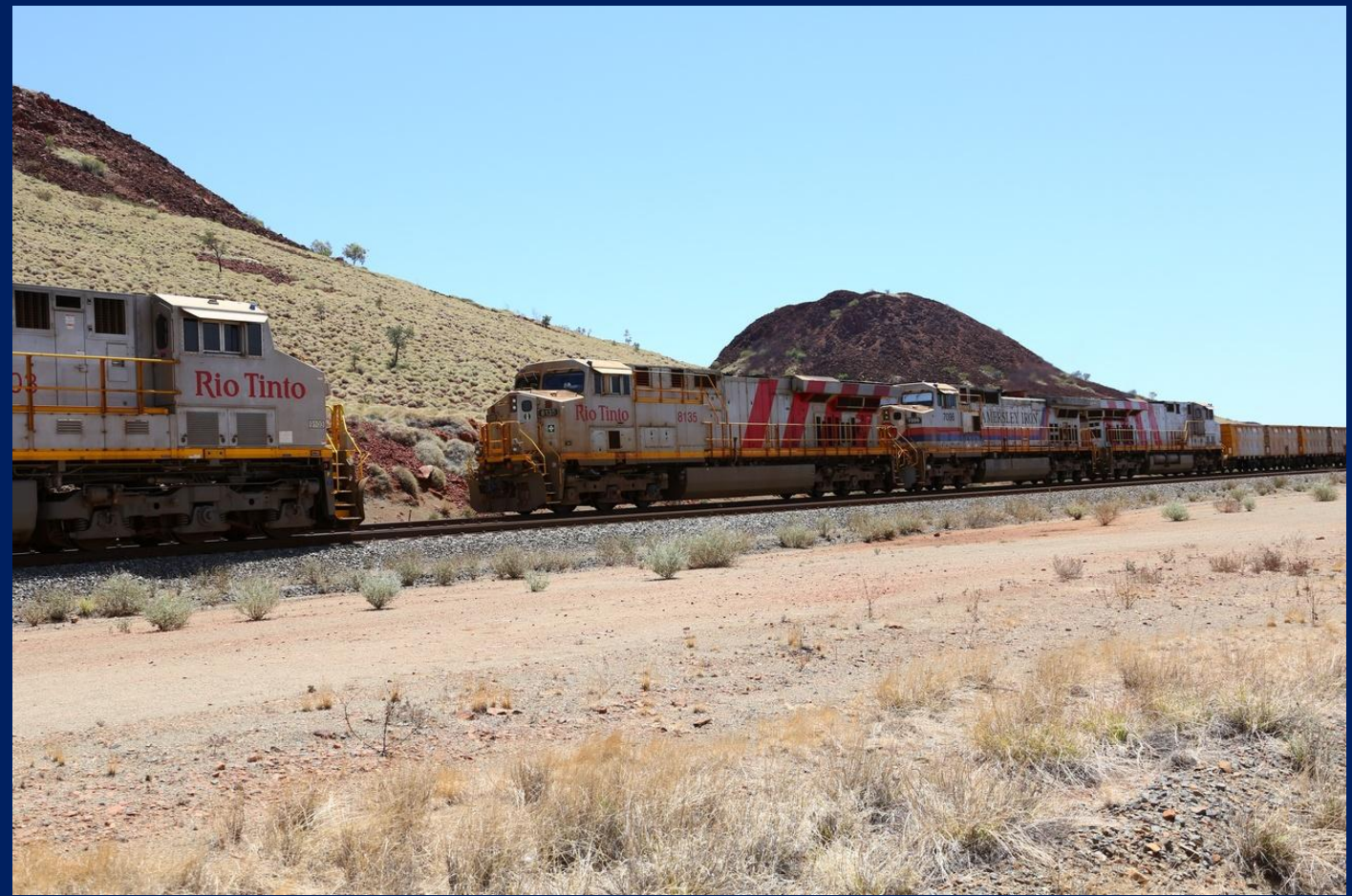
9103 crossing 8135, 7096 & 8122 on empty ore 65km on Cape lambert line 6/3.