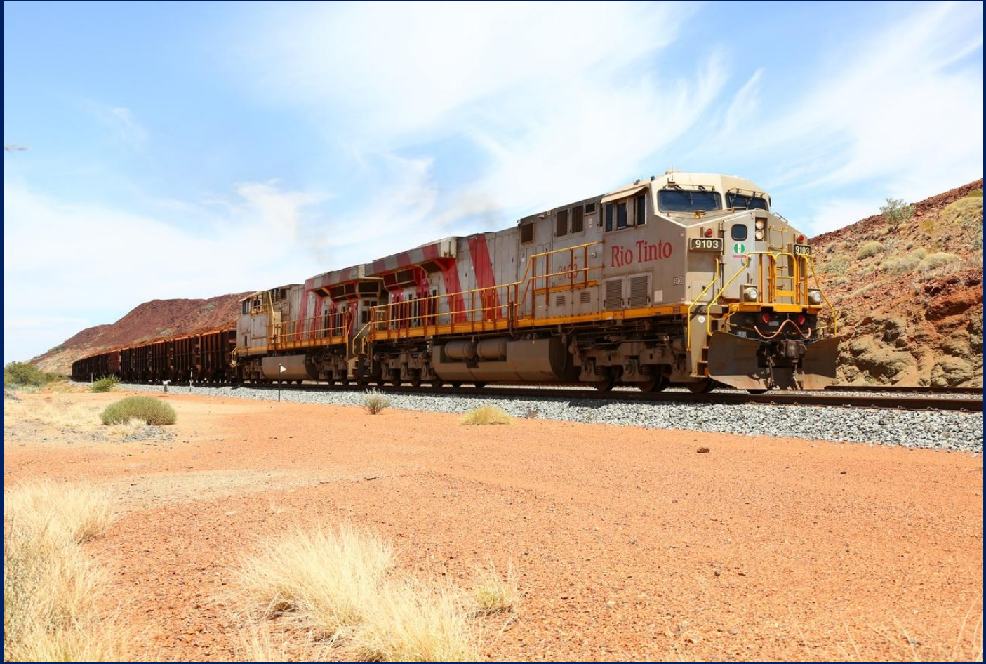
9103 & 9110 on loaded Deepdale ore at 65km Robe line March 6th.