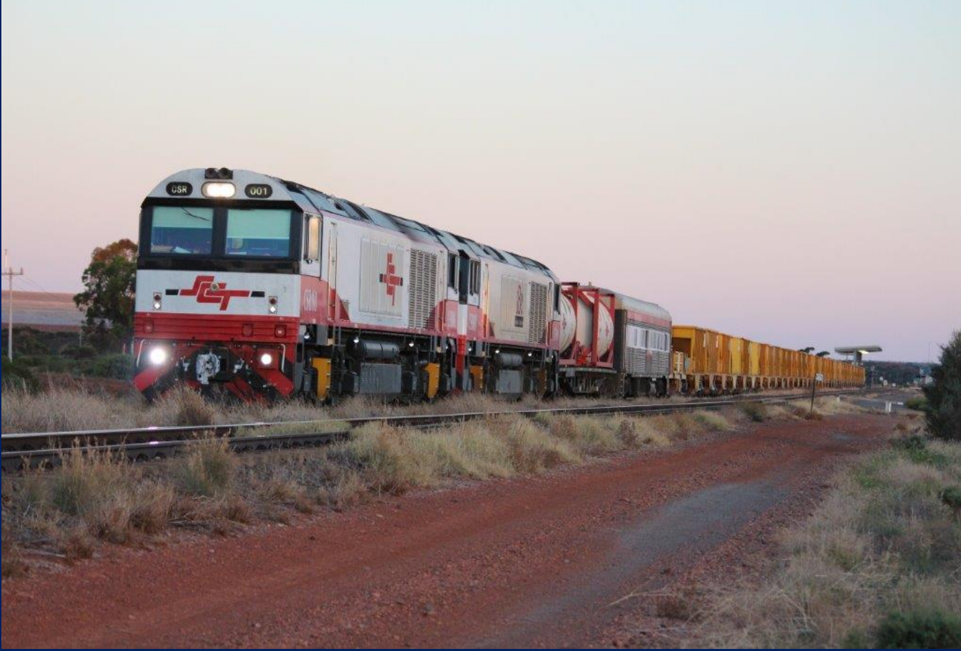
SCT001 & SCT010 on empty ARTC ballast train in Engineers Siding Parkeston just after arrival March 1st.