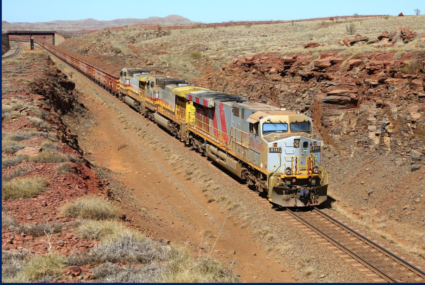
8141, 9404 & 9402 on ore to Dampier at Western Creek/Emu with Robe flyover in distance March 5th.