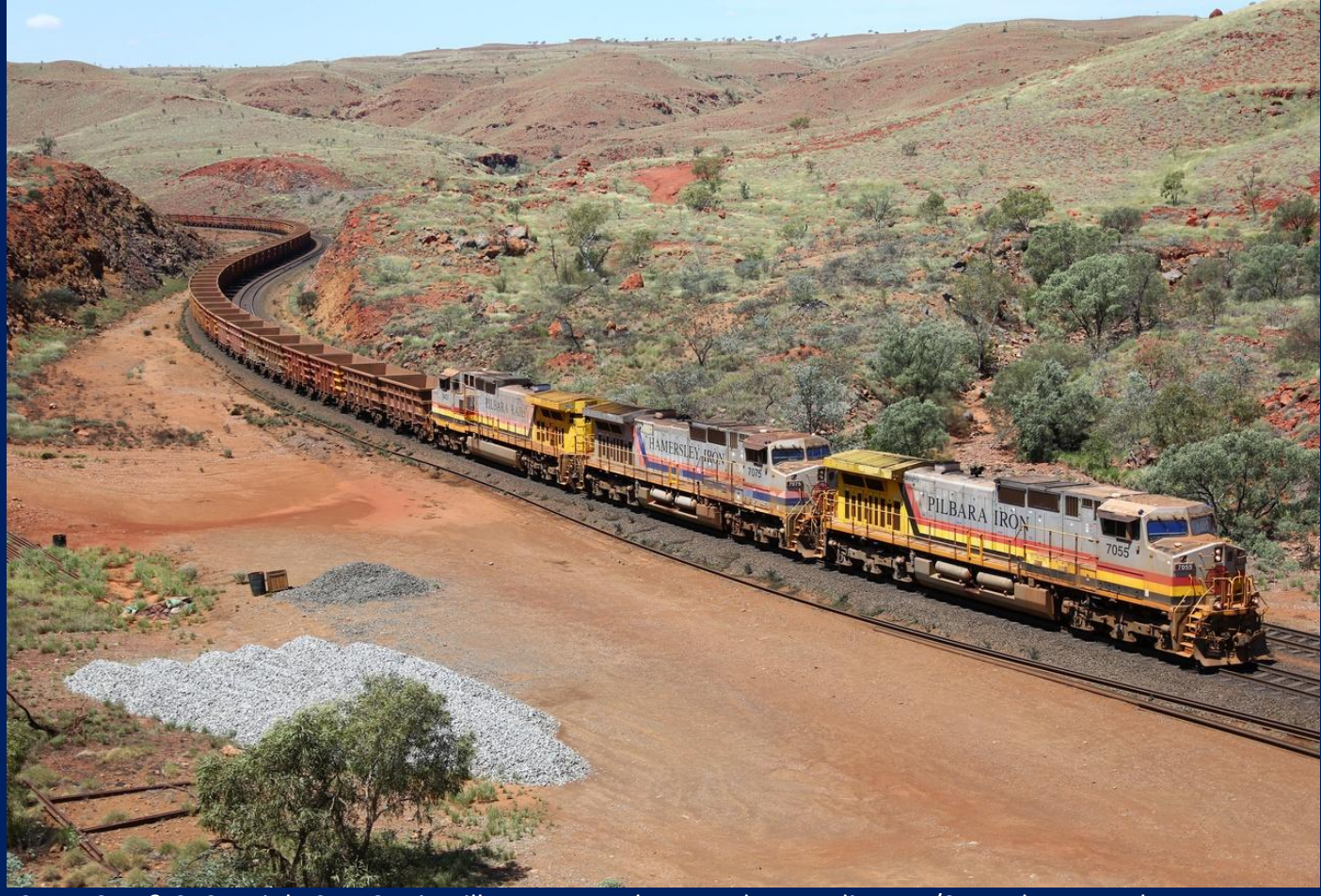
7055, 7075 & 9431 triple 9-44CW in Pilbara Iron and Hamersley Iron livery 5/3.