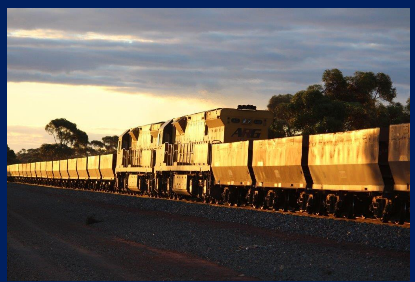
AC4307 & AC4301 DPU units on 1413 ore in golden evening light near Hampton 6/3.