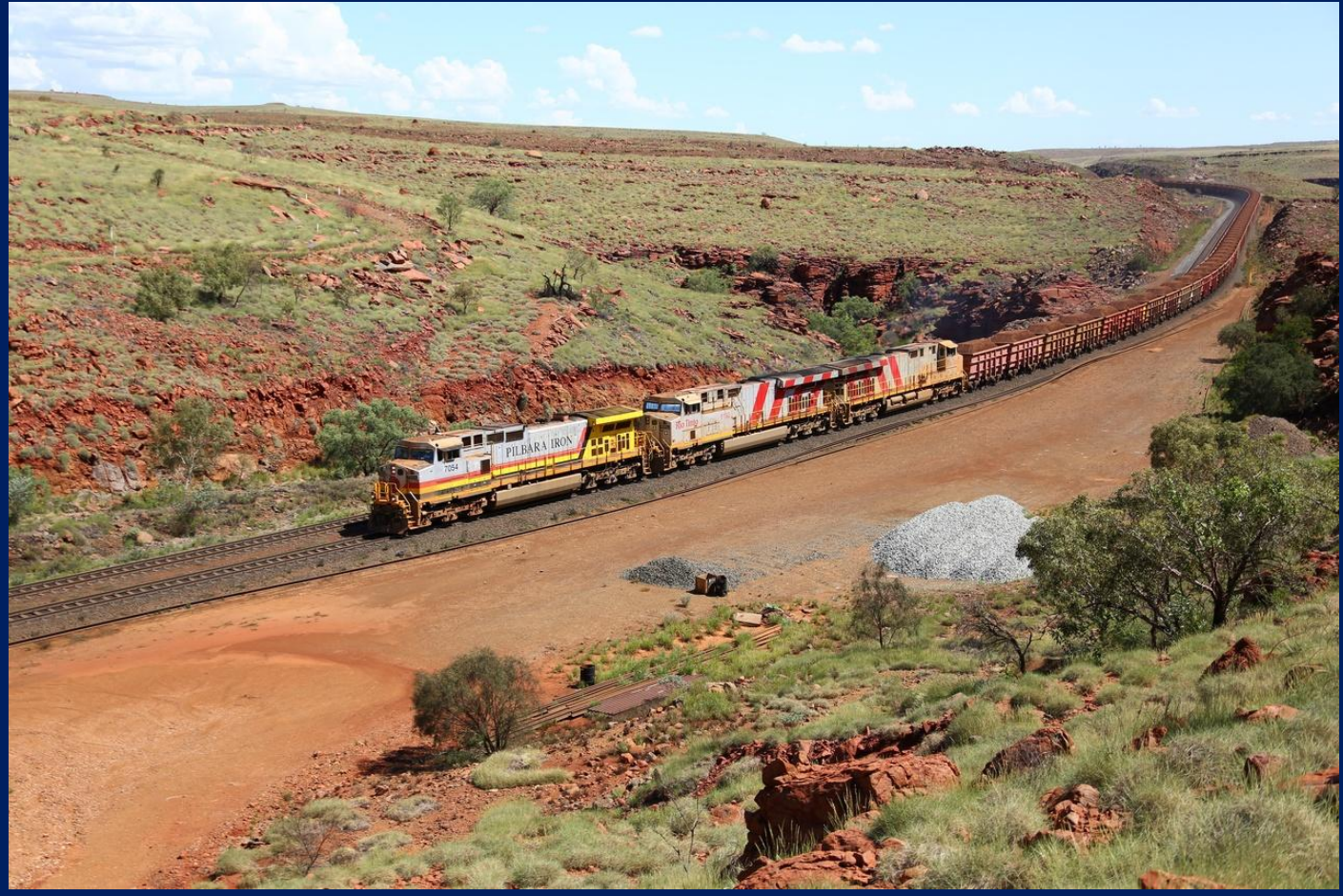
9-CW44 7054 & ES44DCi 8192 & 8163 on loaded ore descending the grade in dynamic brake on March 5th.