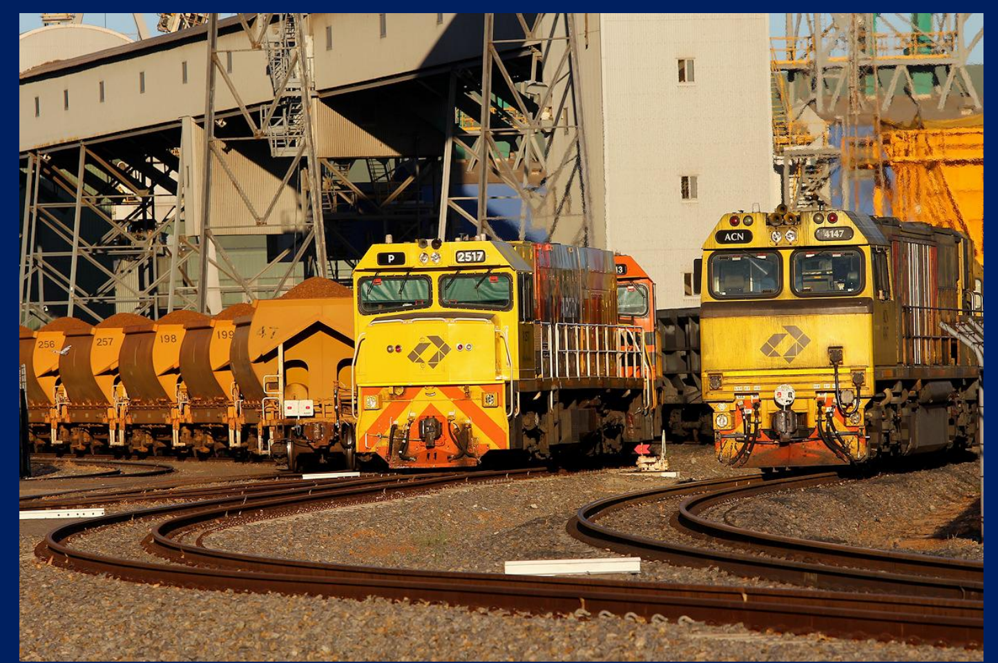
P2517, P2513 & P2508 running round while ACN4147 & ACN4171 pushing back Geraldton Port March 5th.