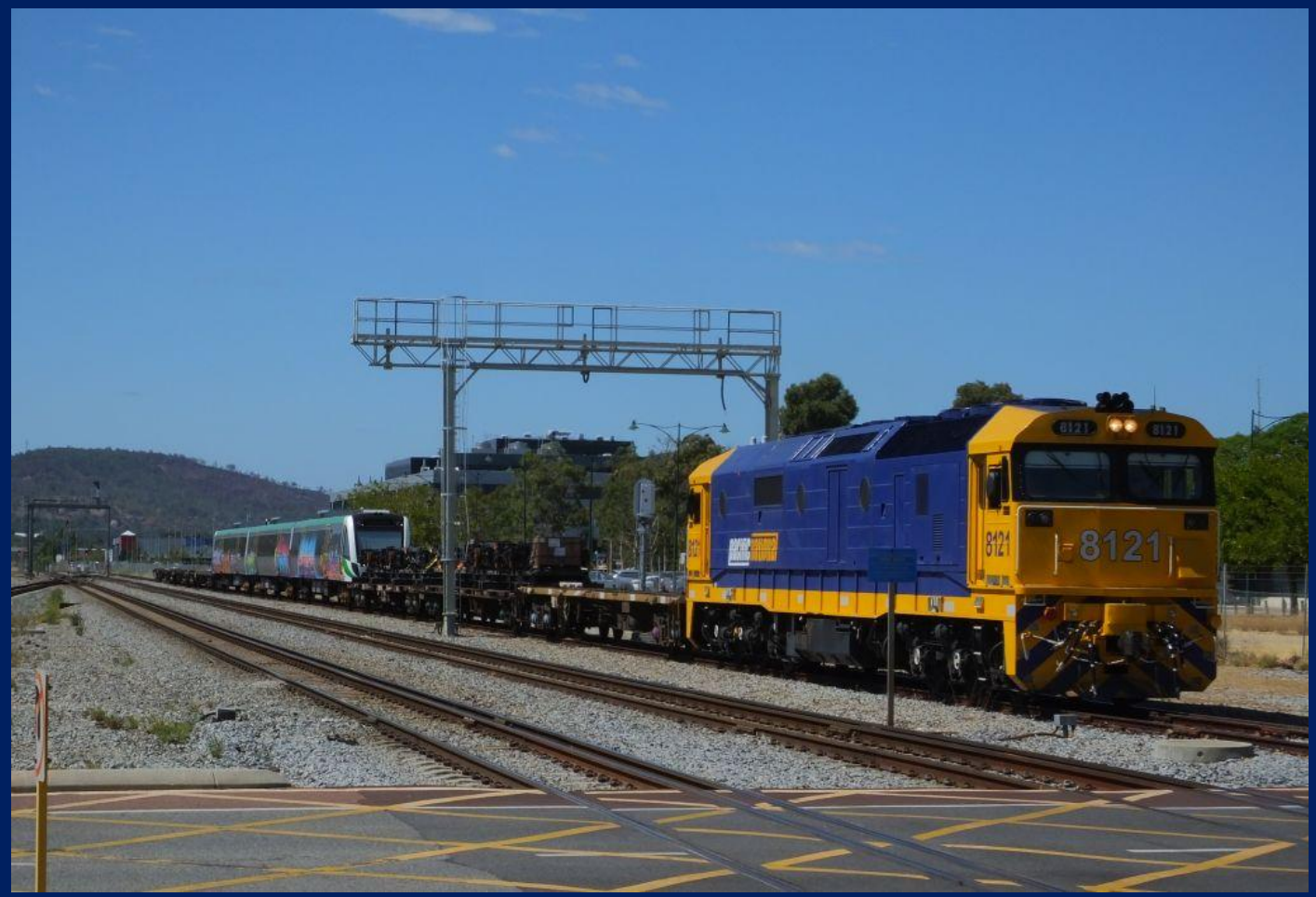
8121 on 6P31 new PTA EMU set 114 being delivered to old workshops Midland 18/3.