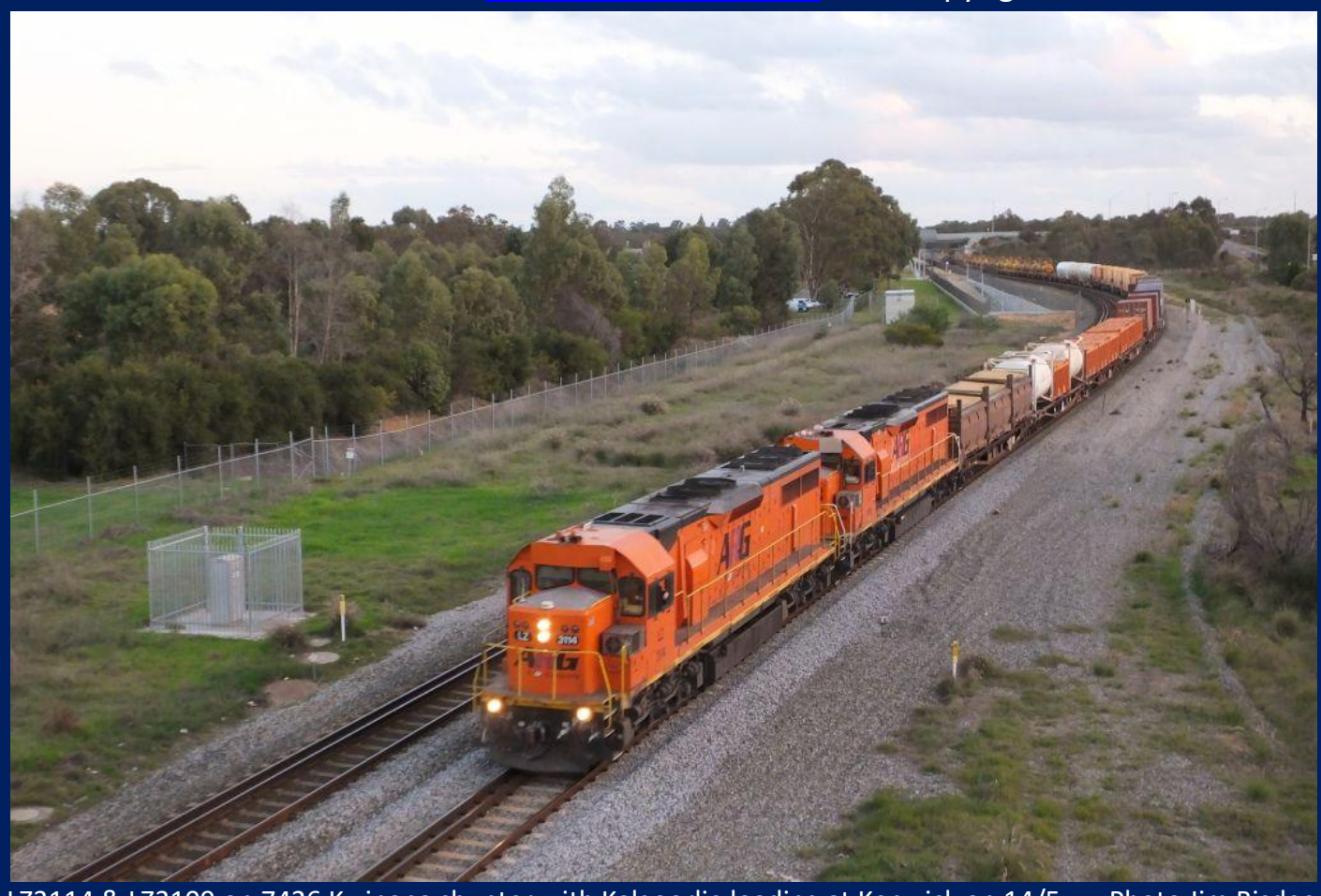
LZ3114 & LZ3109 on 7426 Kwinana shunter with Kalgoorlie loading at Kenwick on 14/5.