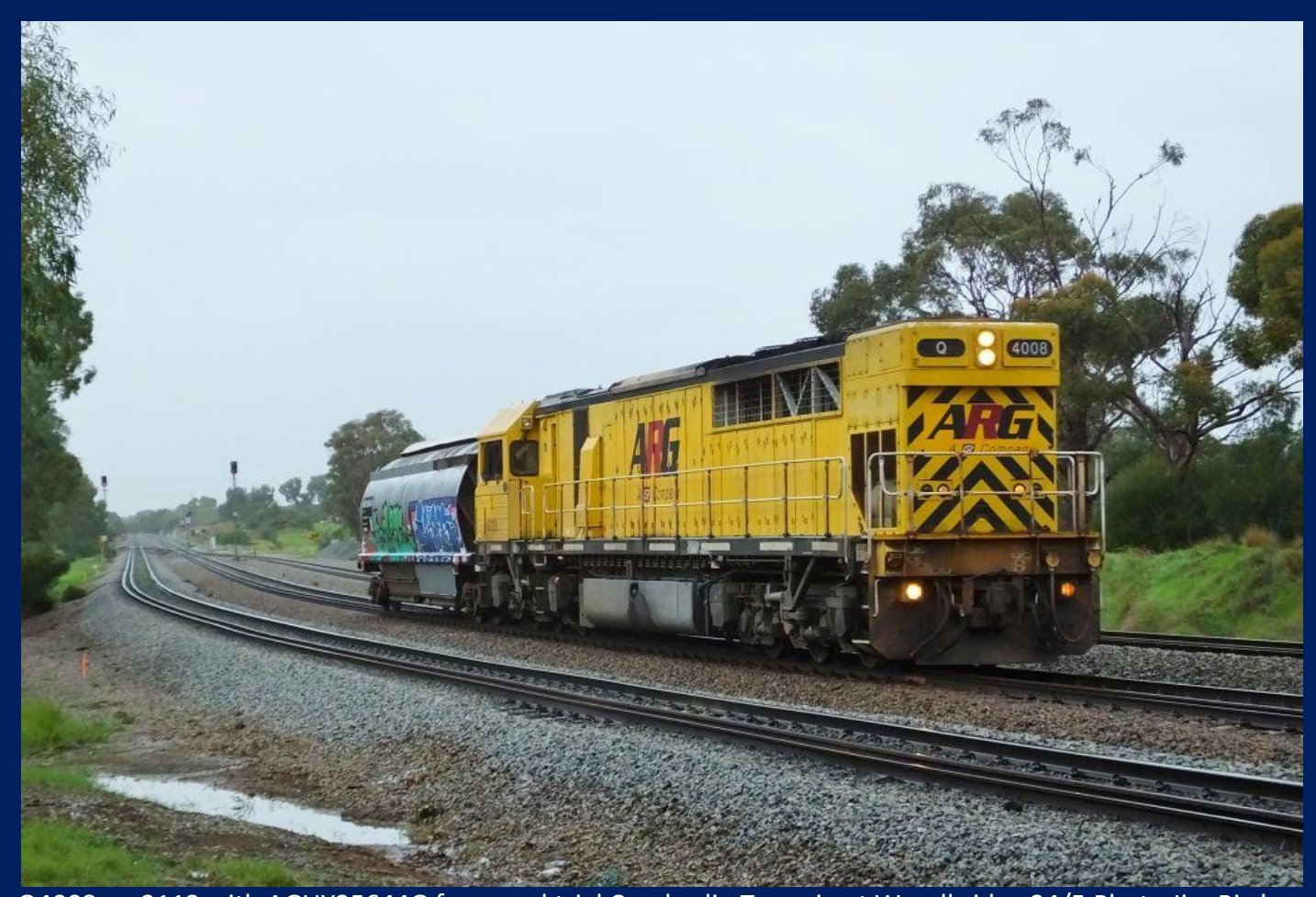
Q4008 on 3113 with AGUY25644G for speed trial Cunderdin Tammin at Woodbridge 24/5.