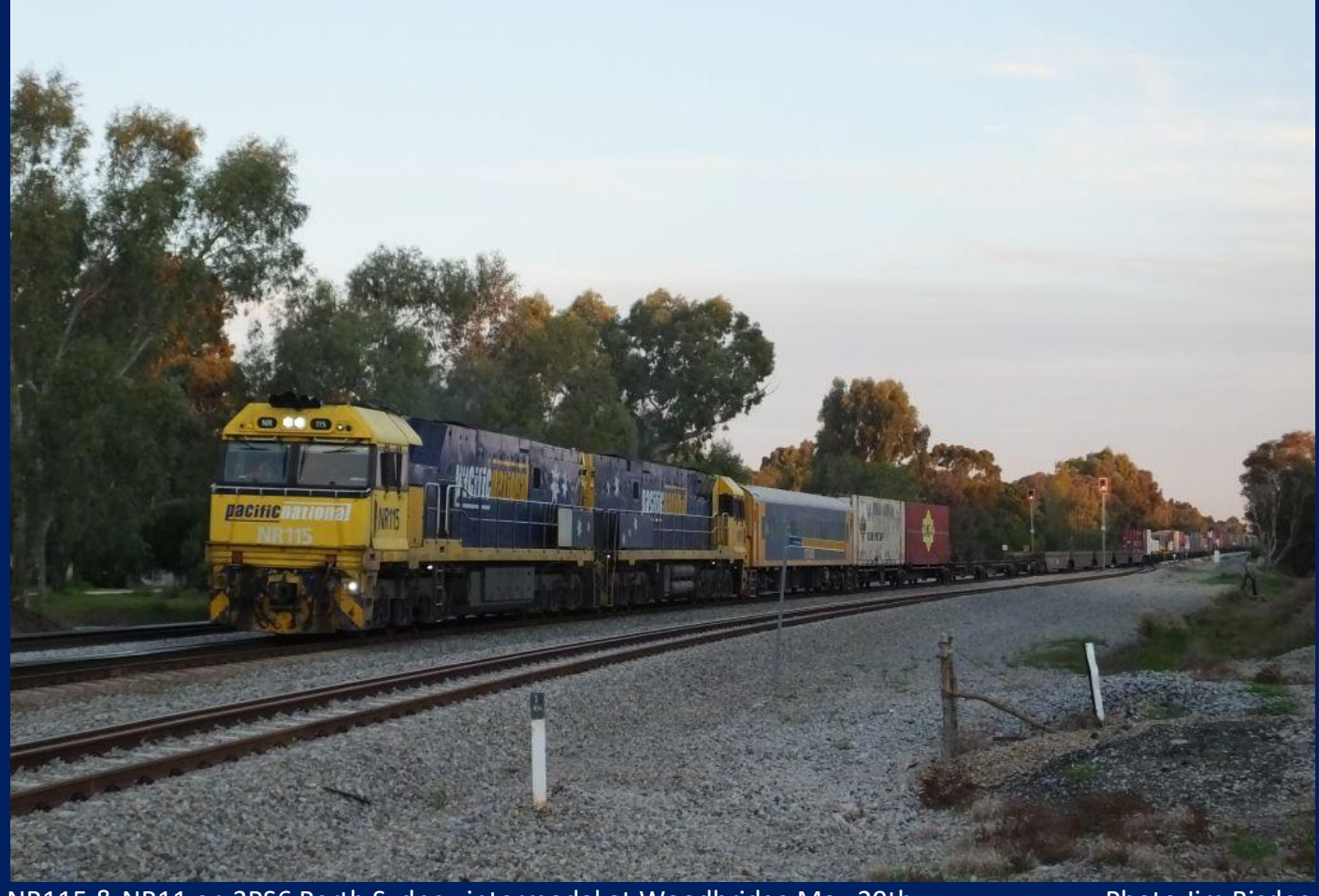
NR115 & NR11 on 3PS6 Perth Sydney intermodal at Woodbridge May 29th.