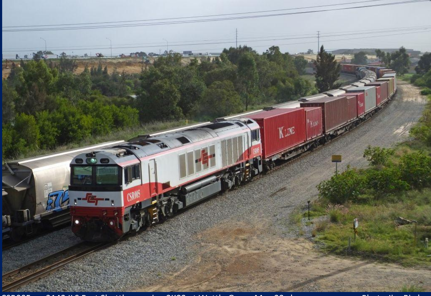
CSR005 on 3142 ILS Port Shuttle crossing 3K03 at Wattle Grove May 23rd.