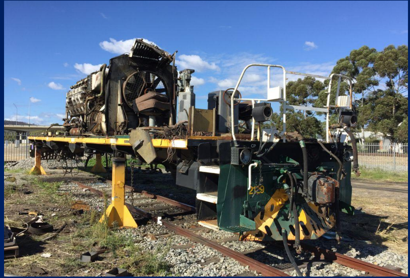
ZB2129 being scrapped at Gemco yard Bellevue May 27th.