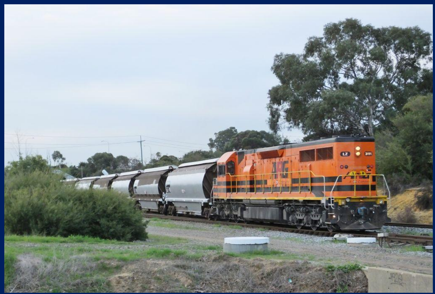
LZ3111 on 5114 empty AGUY grain hoppers crossing over into Forrestfield Yard May 26th.