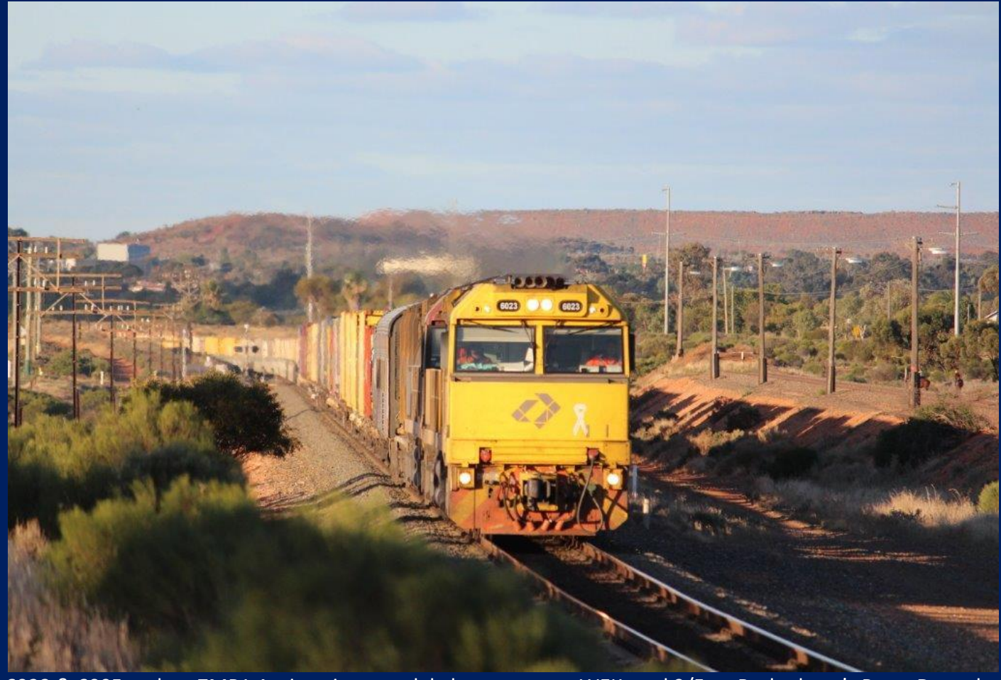
6023 & 6005 on late 7MP1 Aurizon intermodal about to enter WEK yard 9/5.