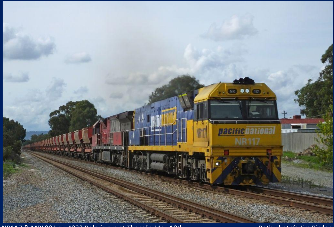
NR117 & MRL004 on 4032 Polaris ore at Thornlie May 18th.