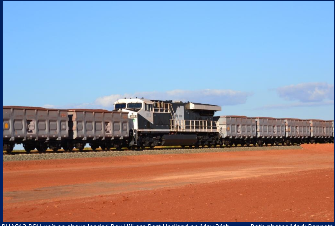
RHA012 DPU unit on above loaded Roy Hill ore Port Hedland on May 24th.