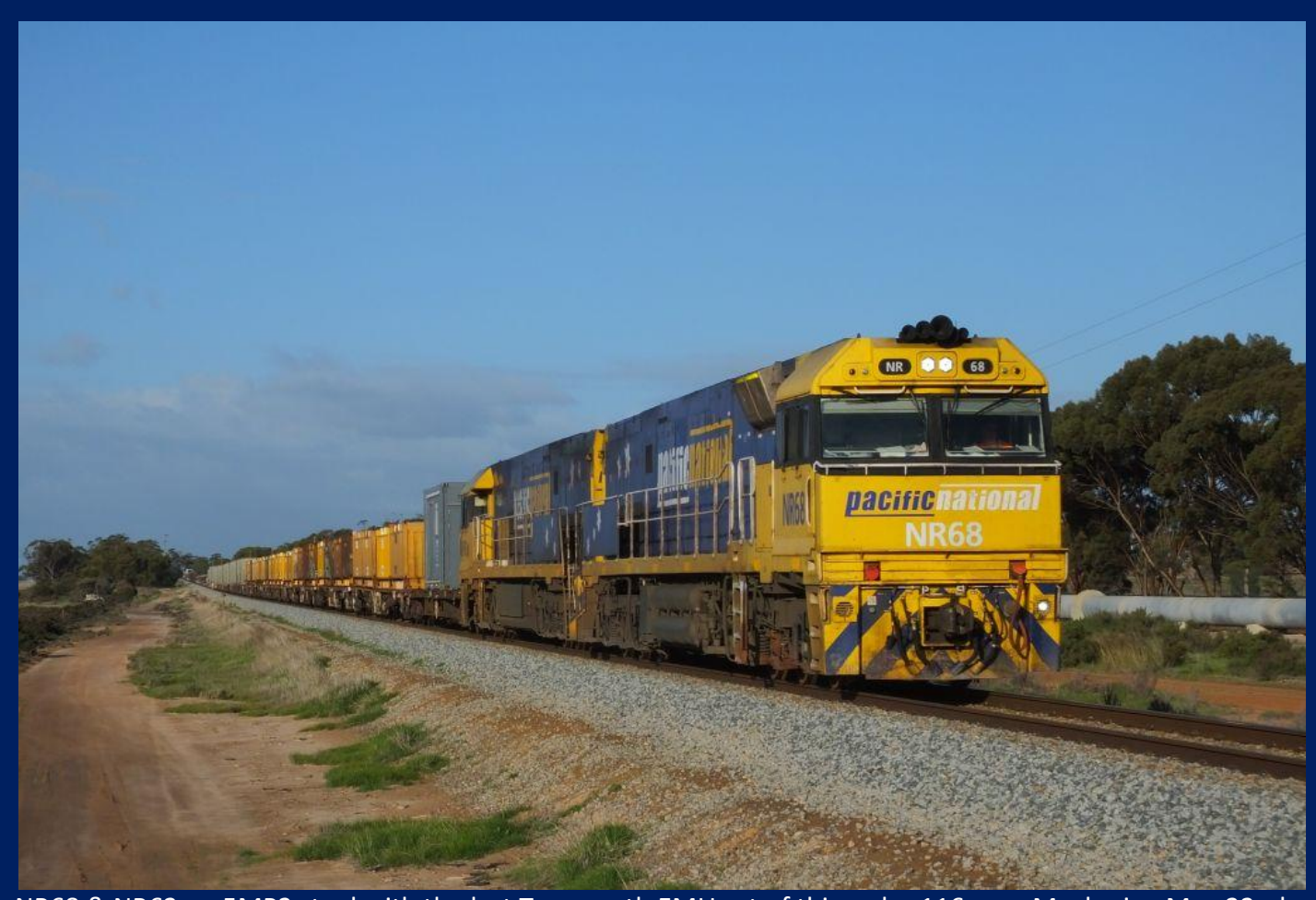
NR68 & NR62 on 5MP2 steel with the last Transperth EMU set of this order 116 near Meckering May 22nd.