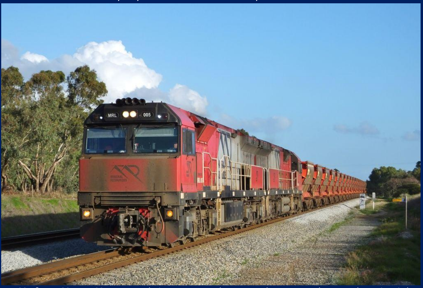
MRL005 & MRL001 on 7035 empty Polaris ore to Mt Walton at Hazelmere May 7th.