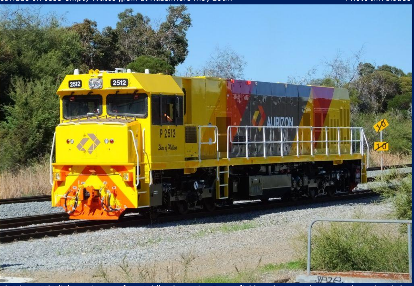
P2512 on 4134 light engine test from Midland entering Forrestfield yard May 11th.