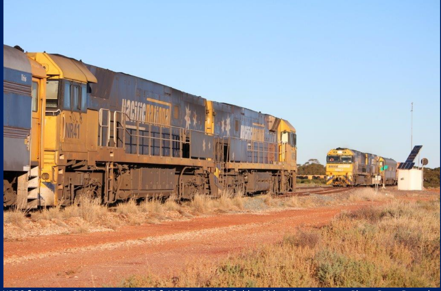
NR56 & NR41 on 3PM4 crossing NR67 & NR37 on 1MP2 Golden Ridge May 3rd.