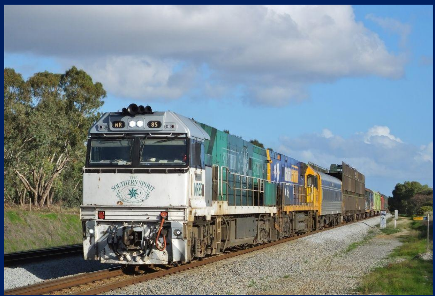
NR85 & NR45 on 7PM5 with triple deck car carriers and vans on lead at Hazelmere 7/5.