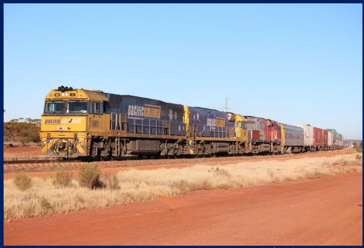
NR1, NR4 & MRL003 on 2MP5 intermodal climbing grade thru Parkeston Yard 11/5.