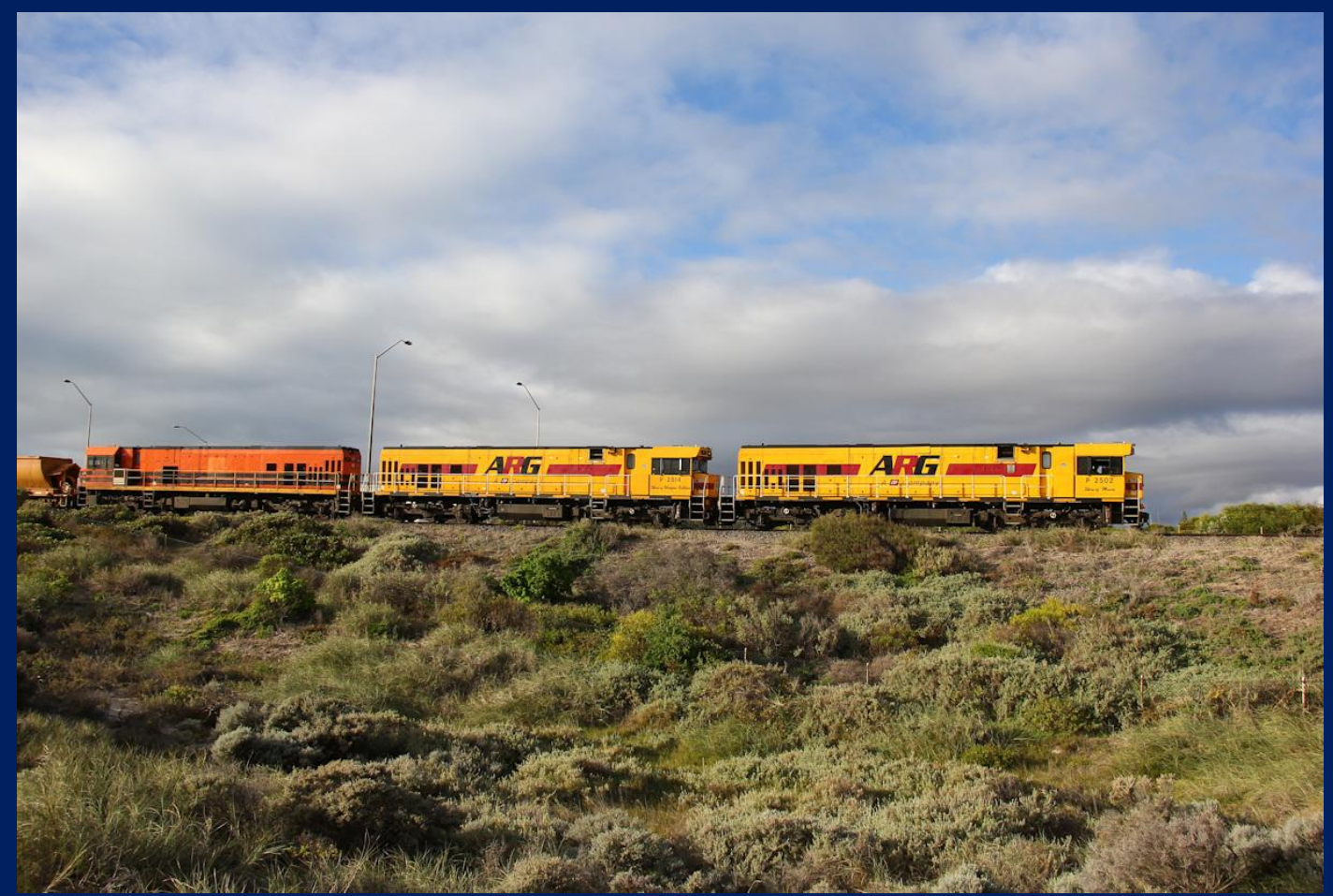
P2502, P2514 & P2506 on 6722 empty Mt Gibson ore Beachlands May 6th.