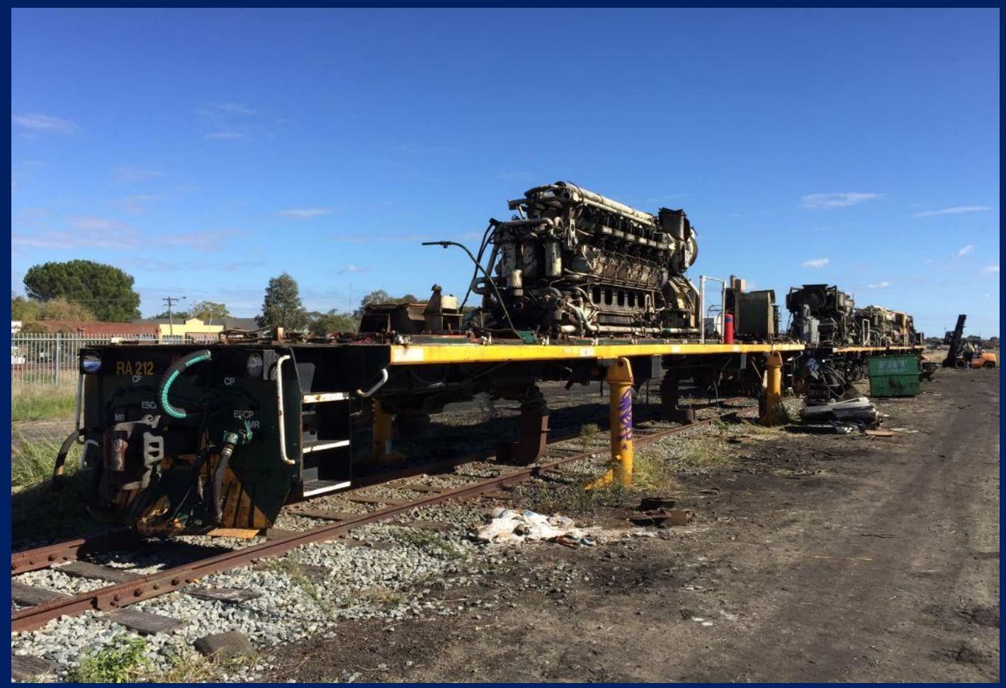
RA212, ZB2125, ZB2120 & R1902 being scrapped at Gemco yard Bellevue May 27th.