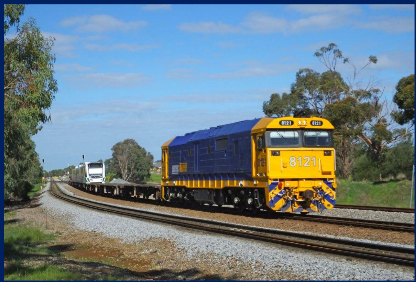
8121 on 6P31 EMU set 116 transfer Kewdale to old Midland workshops May 27th.