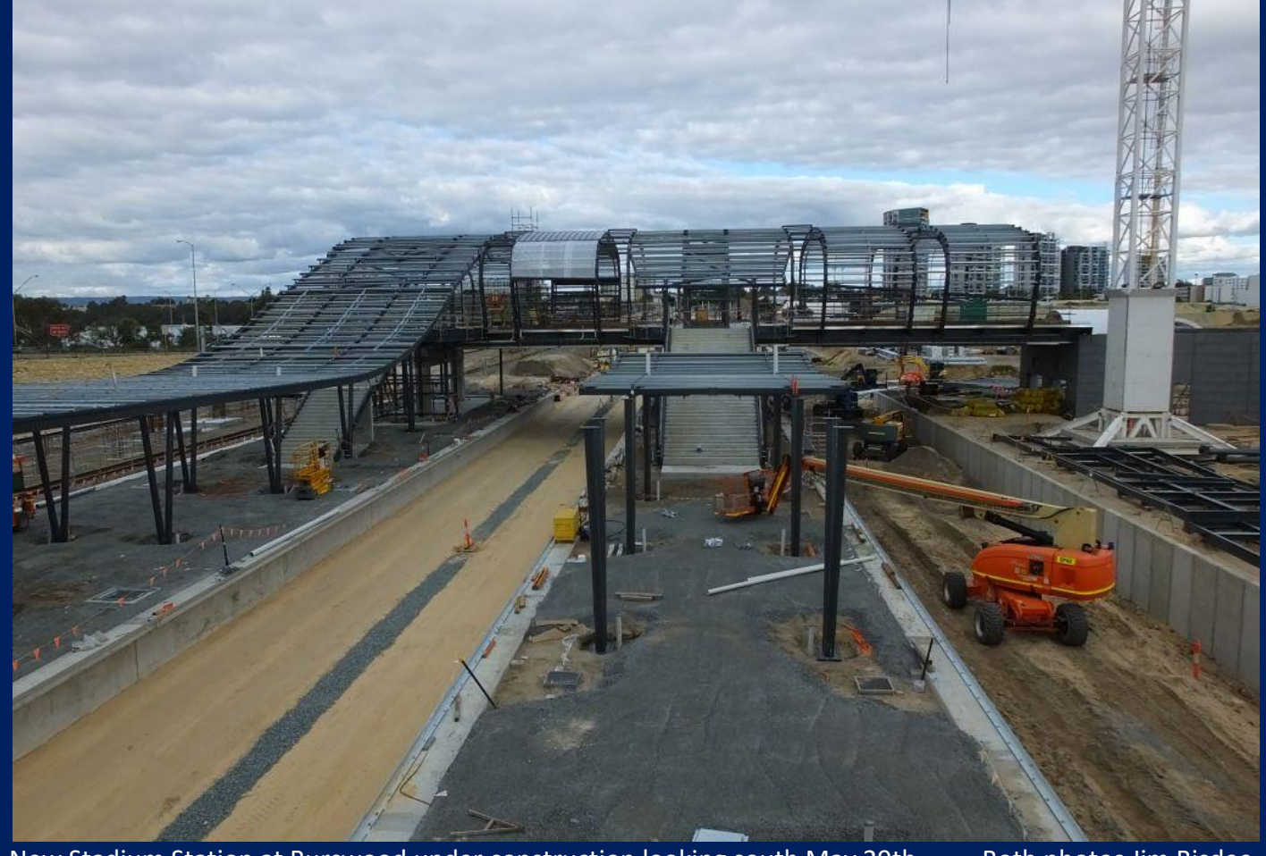
New Stadium Station at Burswood under construction looking south May 29th.