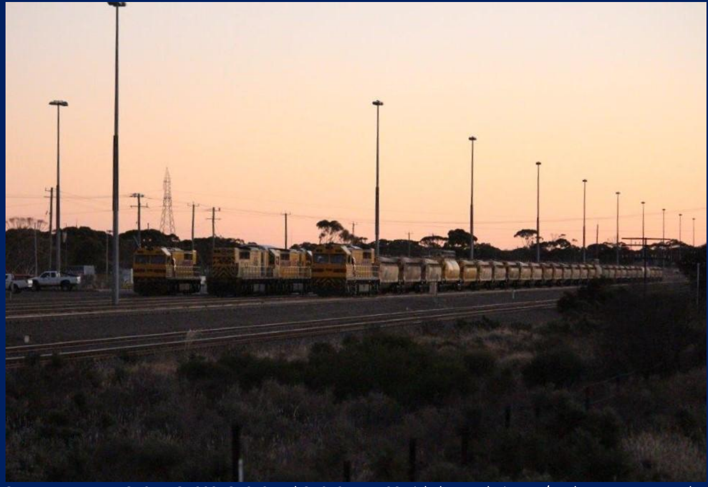
On sunset at WEK Q4015, Q4008, Q4013 and Q4012 on 4438 nickel ex Redmine 11/5.