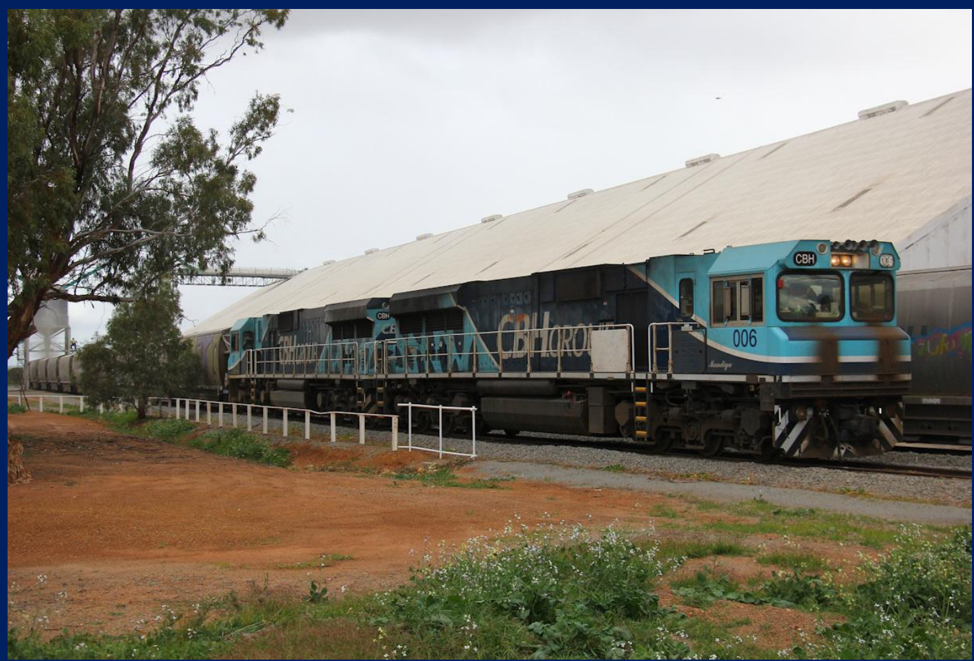
CBH006 & CBH001 loading Watco grain at Coorow CBH grain bin May 14th.