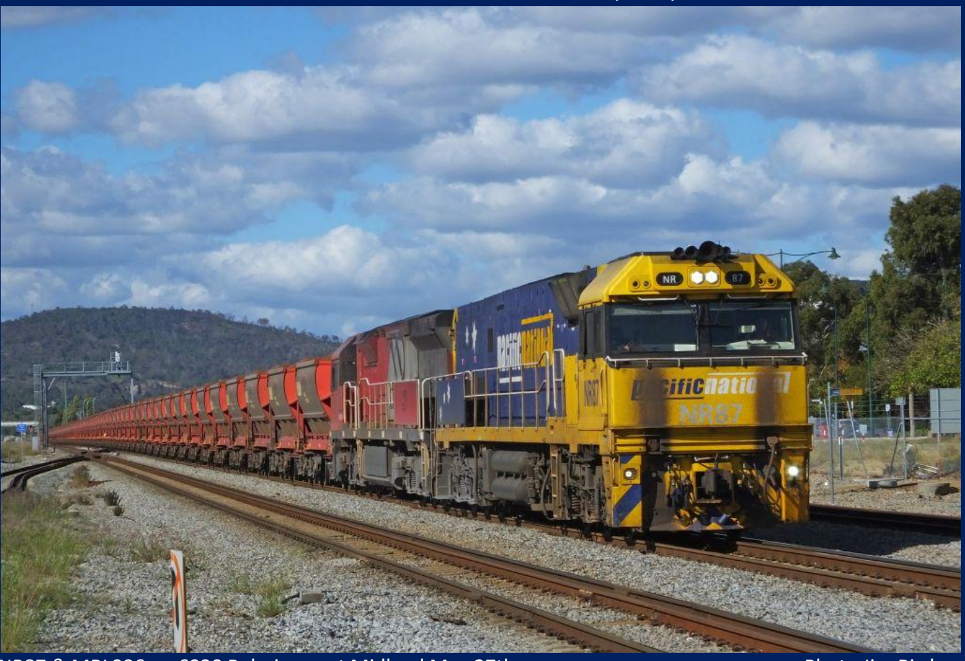
NR87 & MRL006 on 6030 Polaris ore at Midland May 27th.