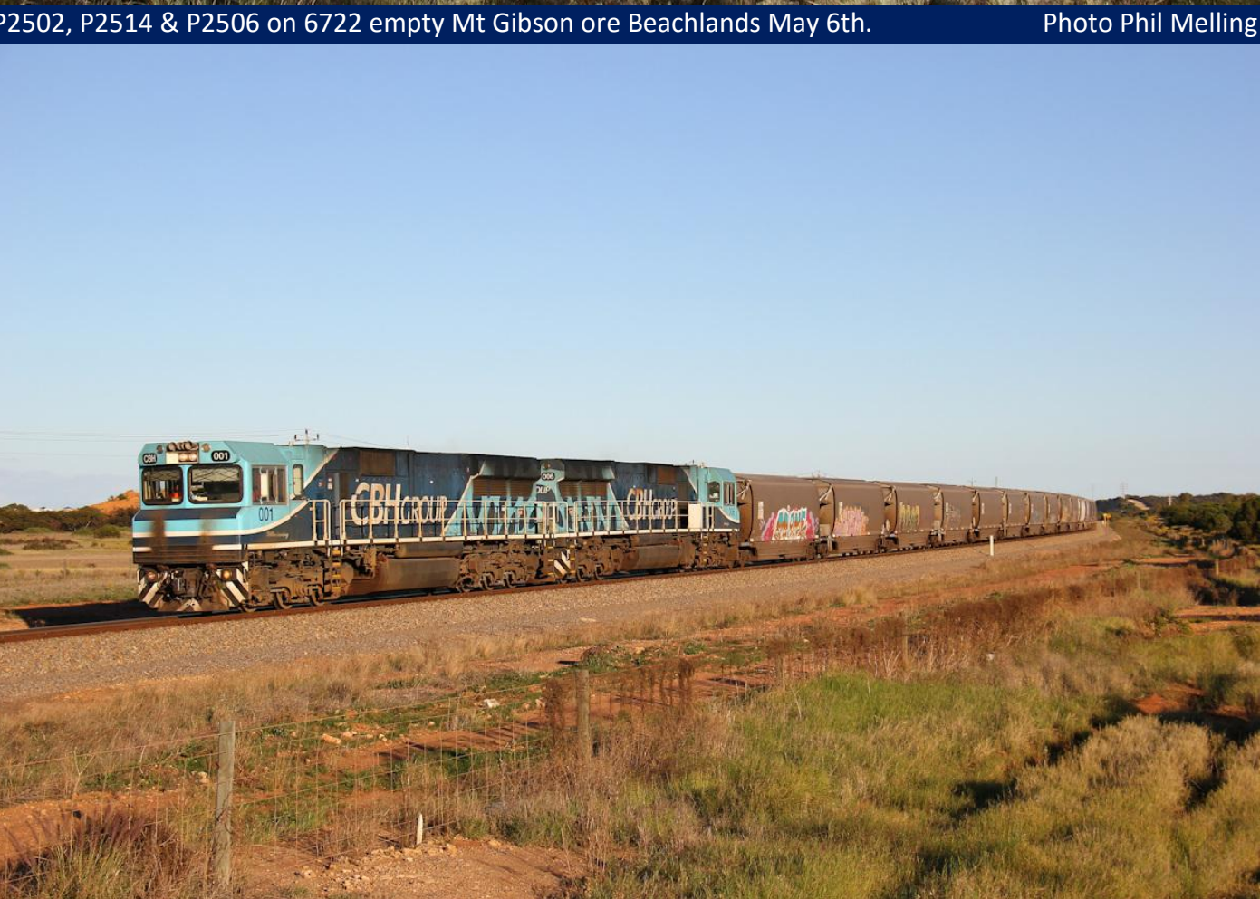
CBH001 & CBH006 on 6G50 empty Watco grain approaching Narngulu May 20th.