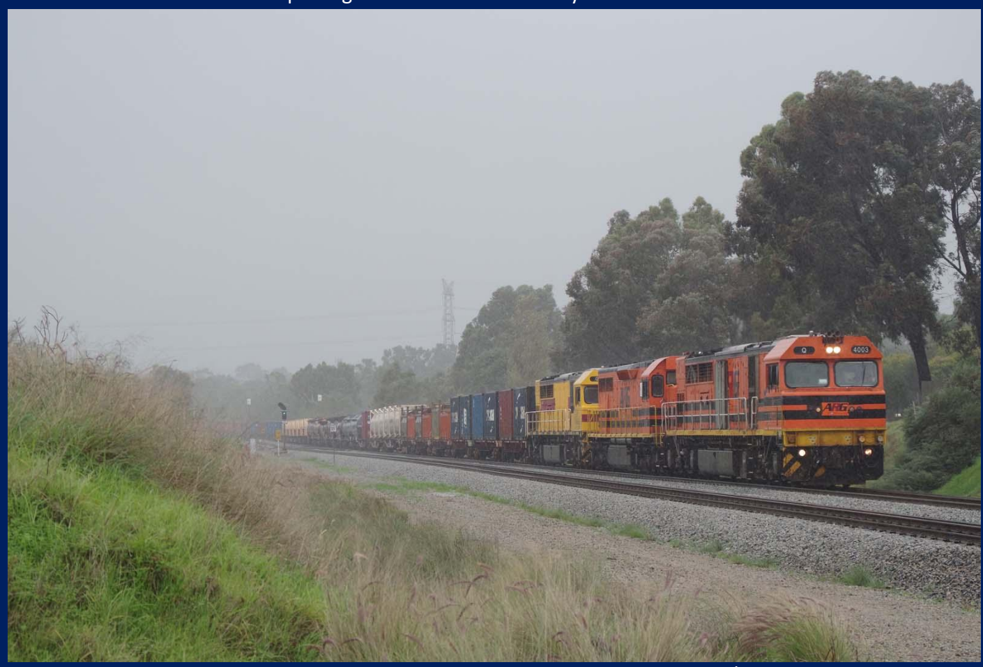
Q4003, LZ3197 & Q4013 on late 6426 freight ex Kalgoorlie at Woodbridge on 21/5.