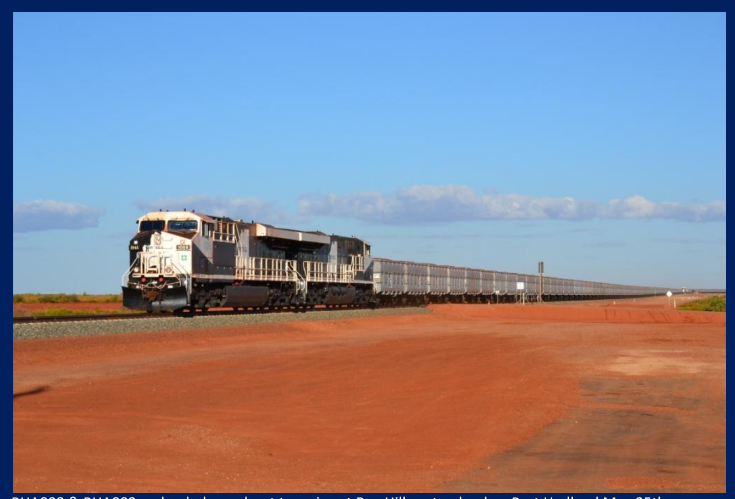
RHA008 & RHA002 on loaded ore about to arrive at Roy Hill port unloaders Port Hedland May 25th.