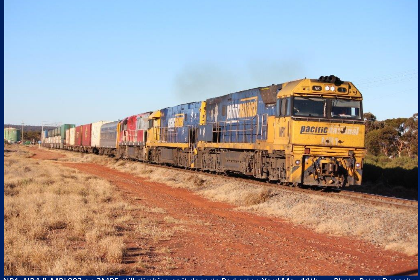
NR1, NR4 & MRL003 on 2MP5 still climbing as it departs Parkeston Yard May 11th.