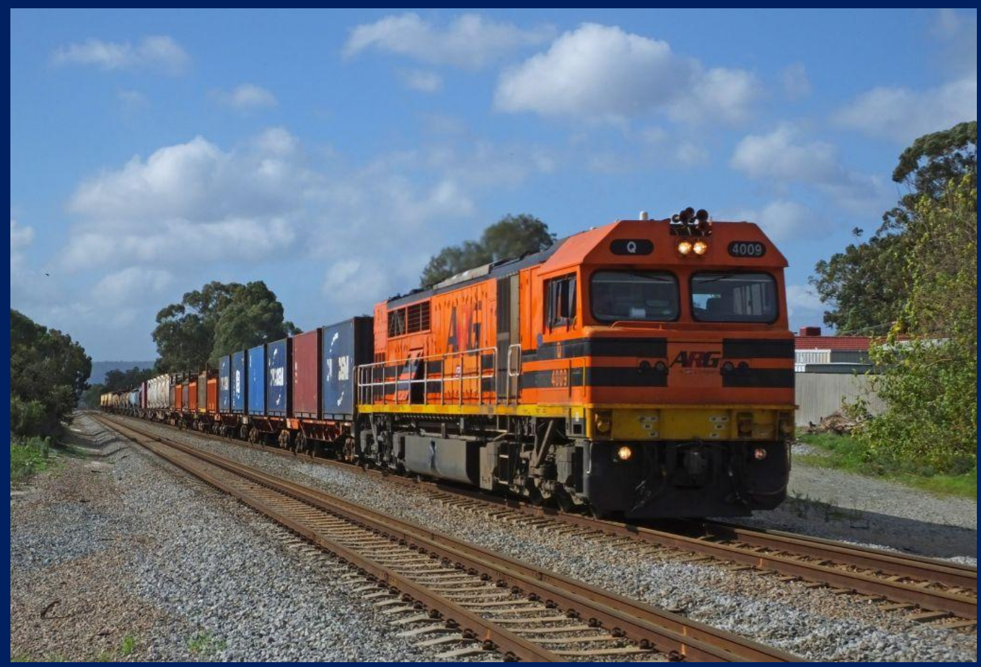
Q4009 on very late 6426 Kwinana shunter with loading ex Kalgoorlie at Thornlie 21/5.