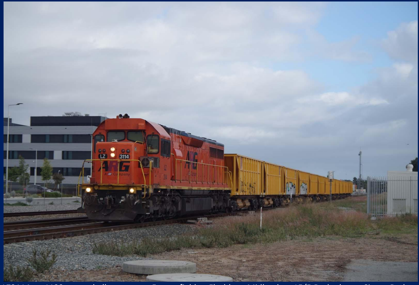
LZ3114 on 1133 empty ballast wagons Forrestfield to Flashbutt Midland on 15/5.