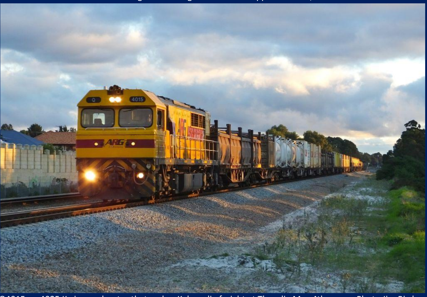
Q4015 on 4025 Kwinana shunter that makes Kalgoorlie freight at Thornlie May 4th.