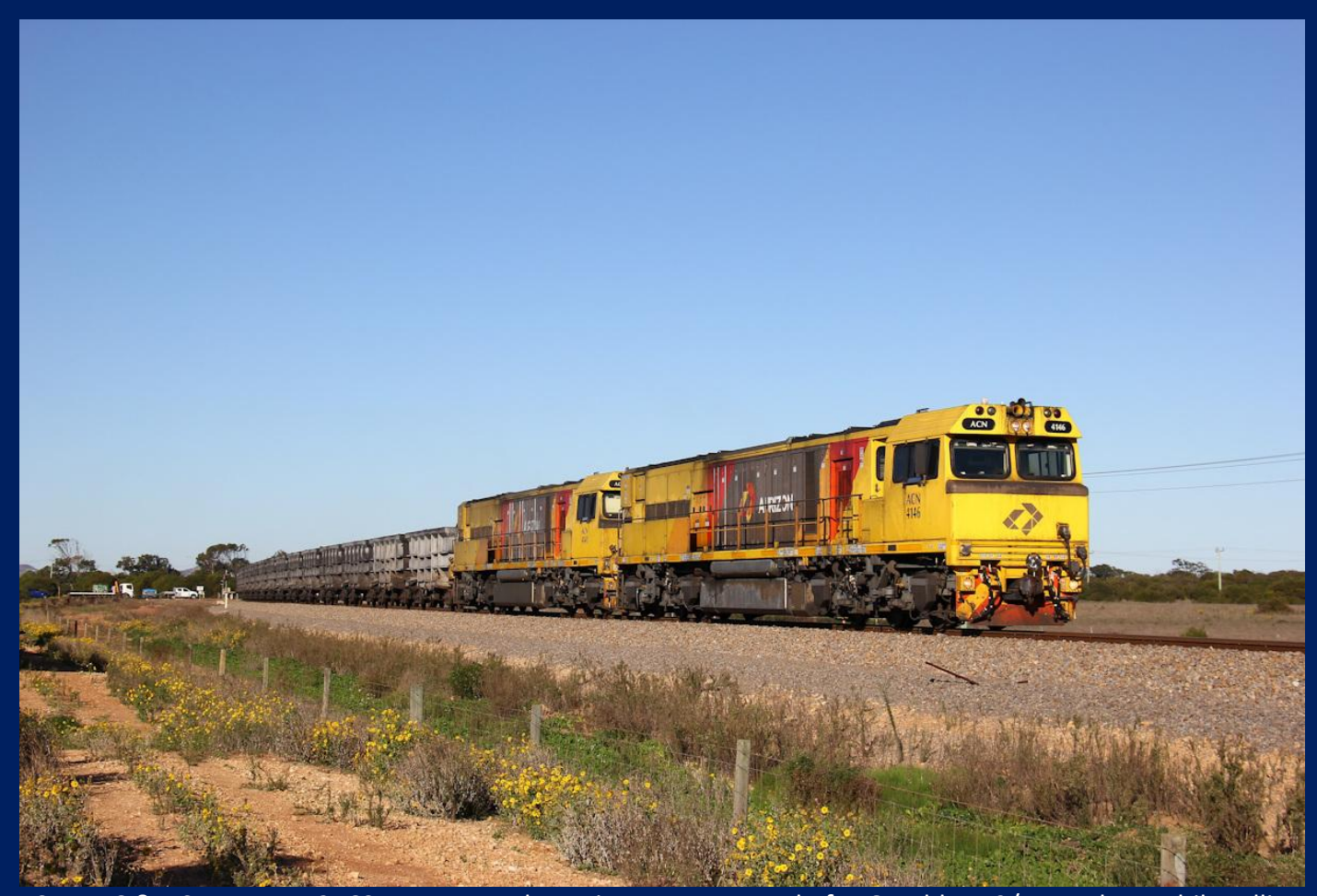
ACN4146 & ACN4141 on 2763 Karara ore departing West Narngulu for Geraldton 9/5.