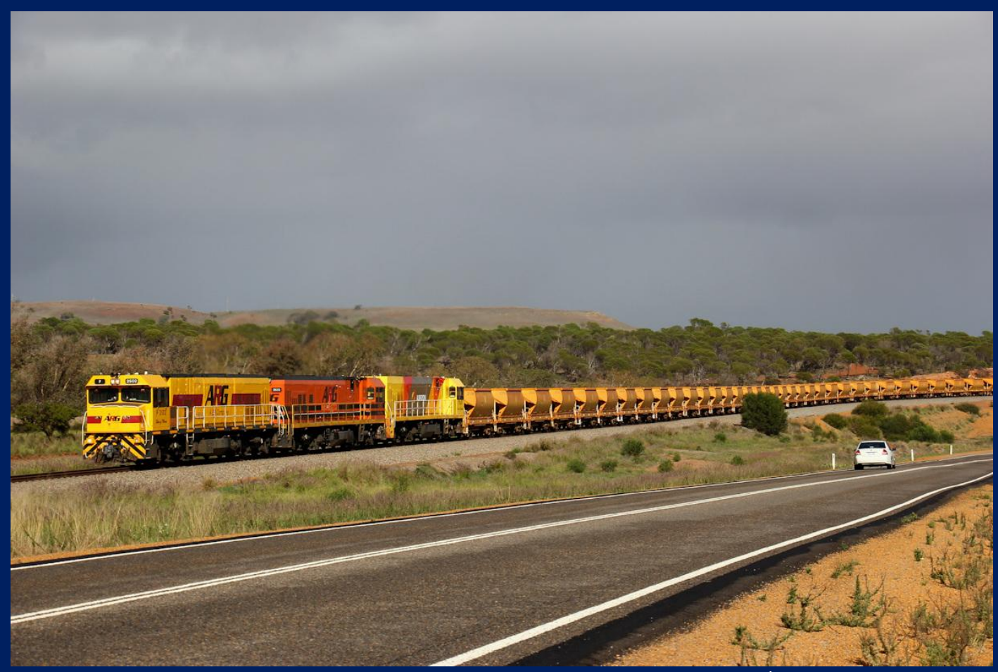
P2502, P2513 & P2504 on 1720 empty Mt Gibson ore old Grants stopping place 22/5.