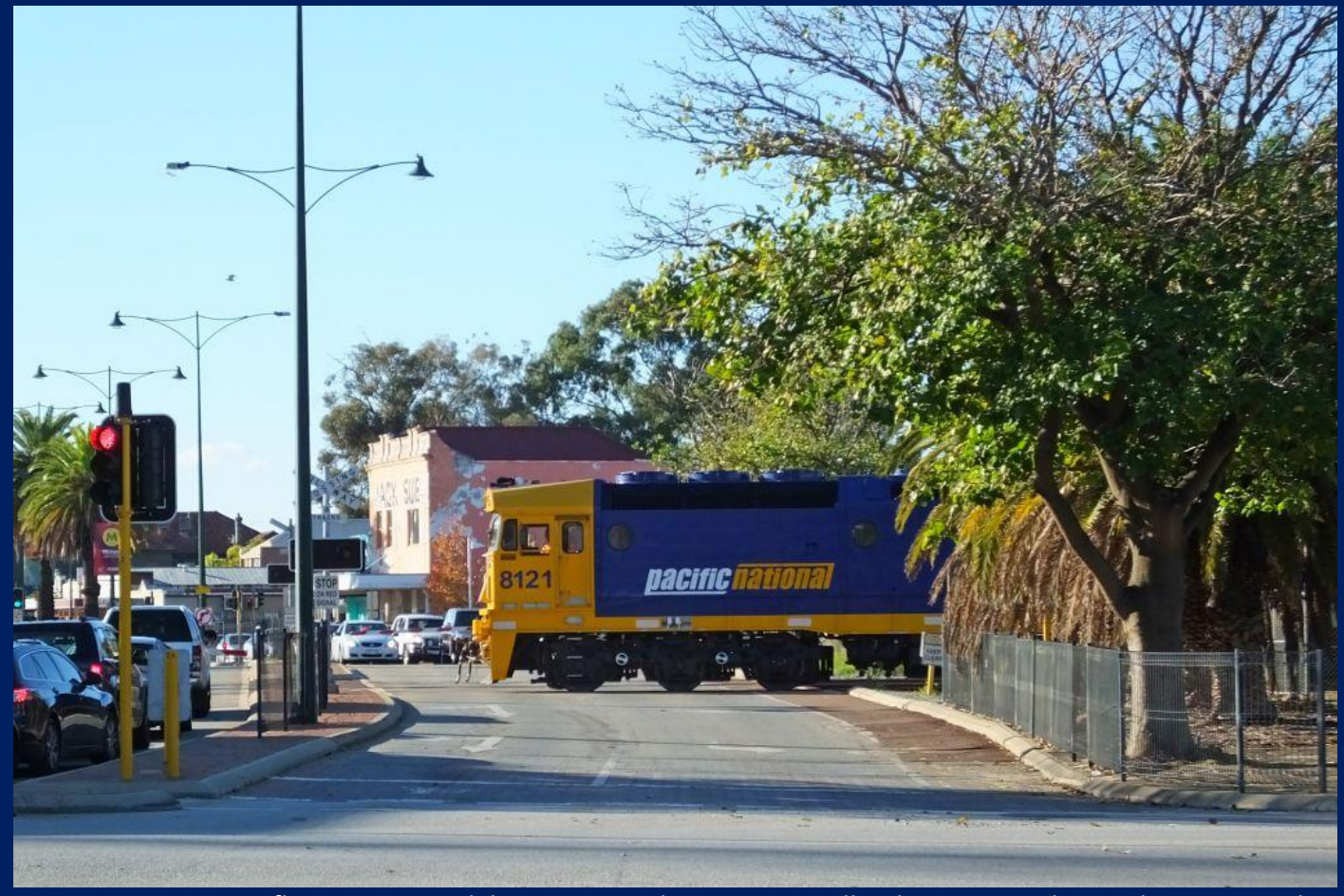
8121 on 6P32 empty flattops to Kewdale crossing Helena Street Midland on May 26th.