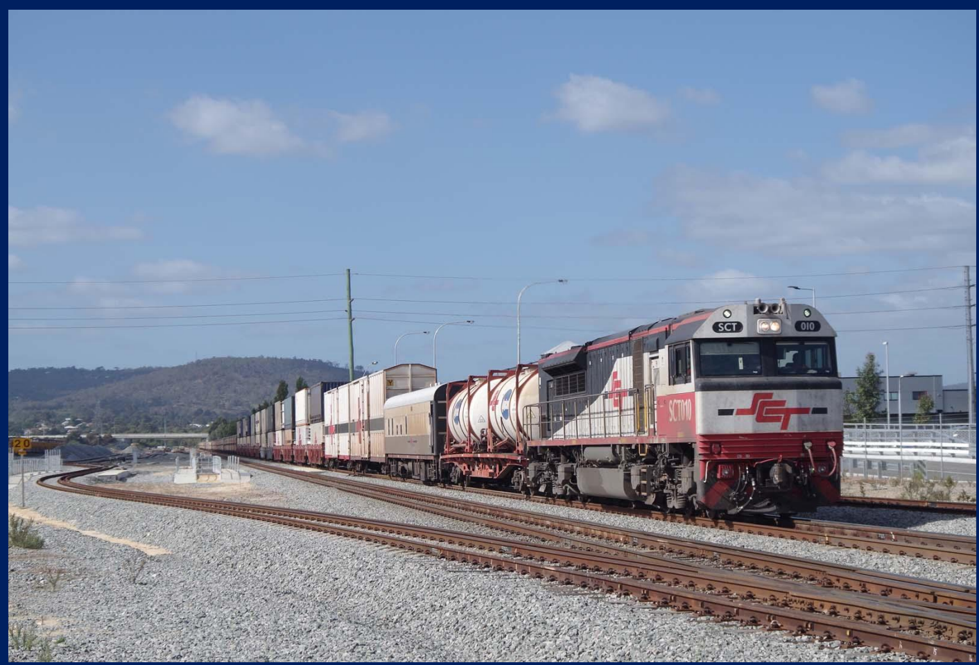
SCT010 on late 6MP9 freight with rare single locomotive working at Midland May 16th.