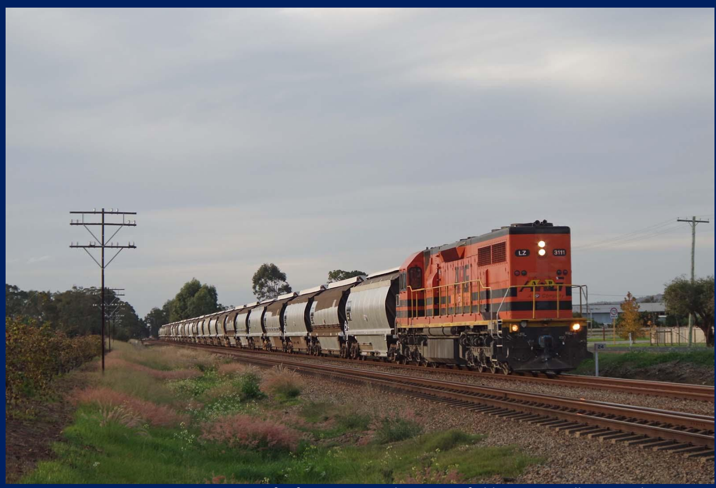
LZ3111 on 5114 AGUY grain wagon transfer from Avon Yard to Forrestfield at Herne Hill May 26th.