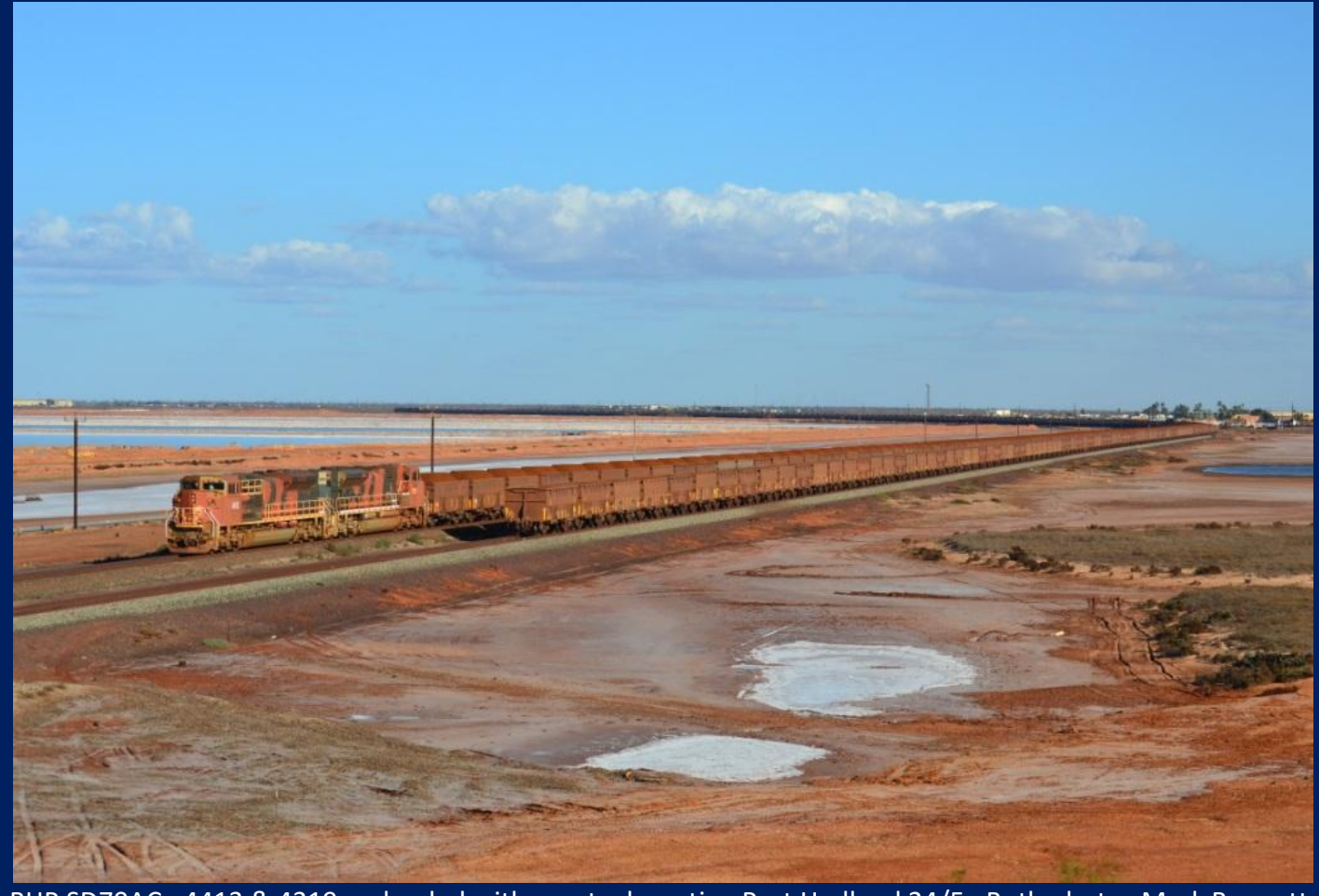
BHP SD70ACe 4413 & 4319 on loaded with empty departing Port Hedland 24/5.