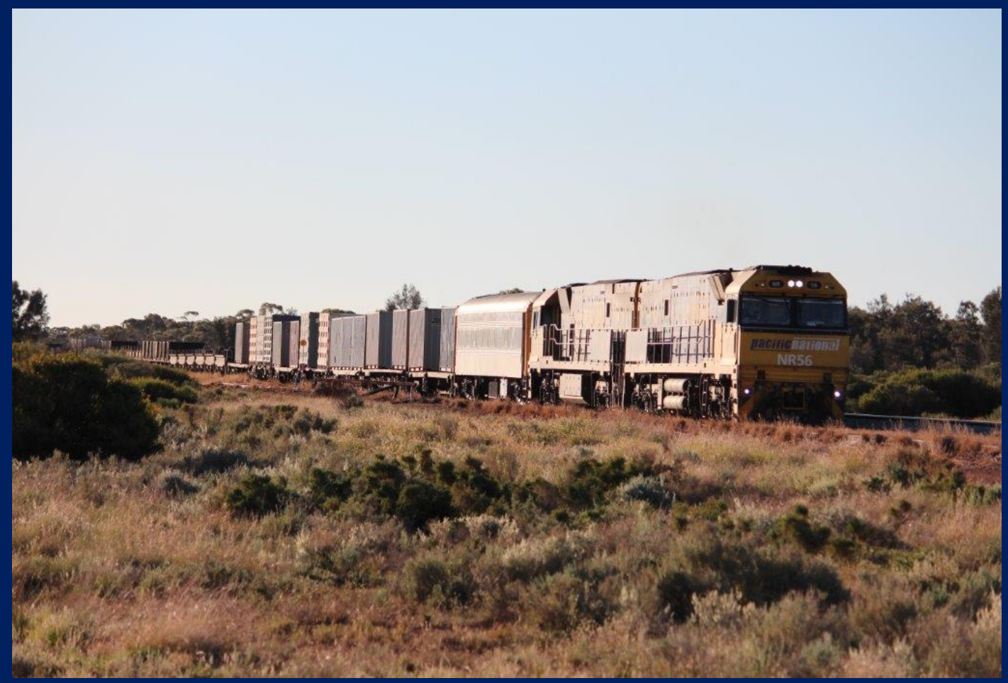
NR56 & NR41 on 3PM4 entering loop at Golden Ridge first crossing point on west end of Trans line 3/5.