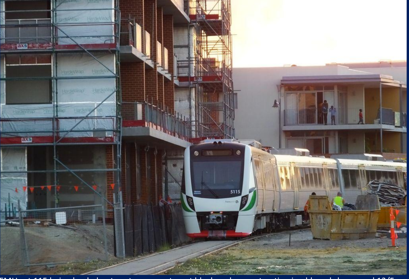
EMU set 115 being hauled out past new apartment block under construction in old workshops yard 13/5.