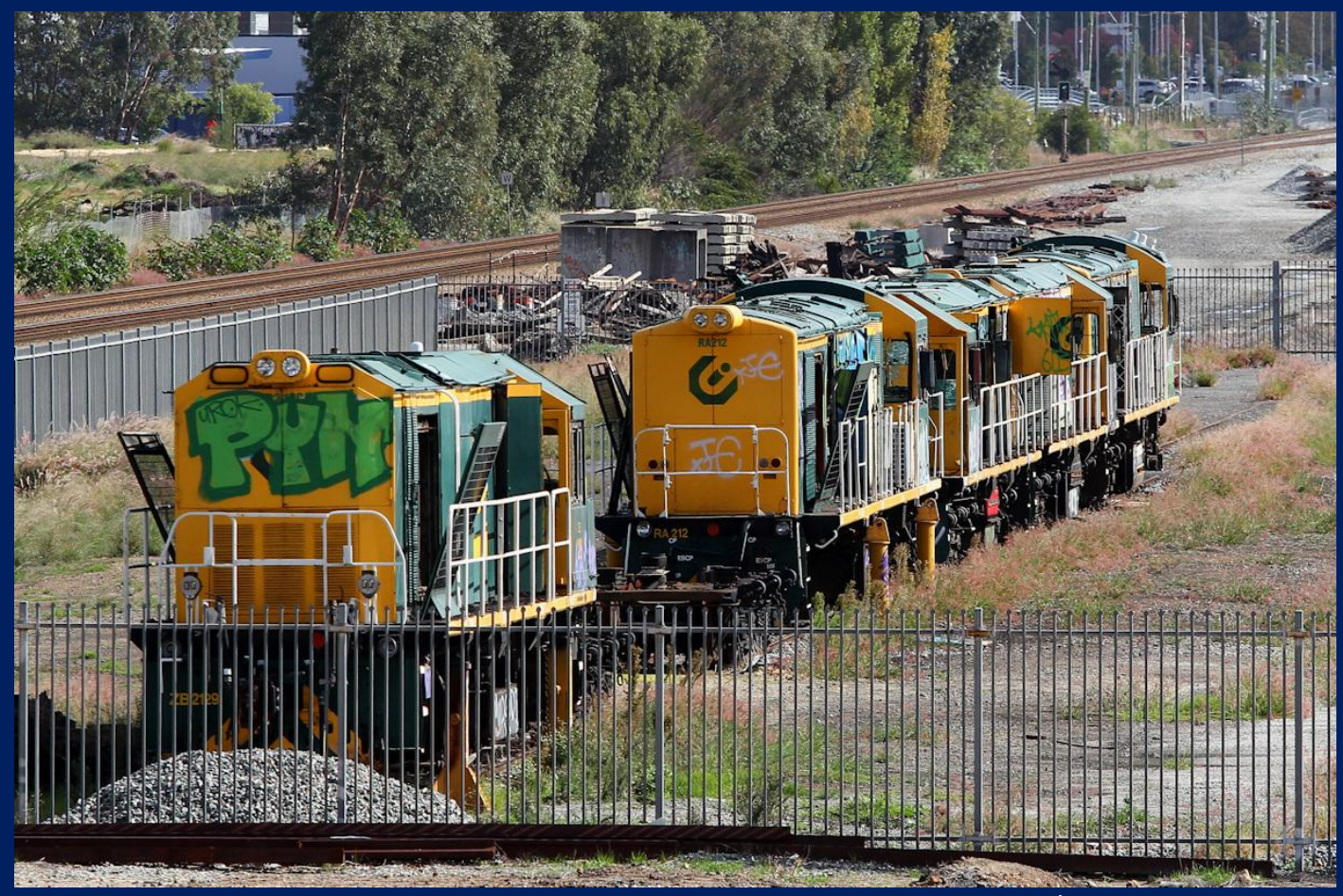
ZB2129, RA212, ZB2125, ZB2120 & R1902 to be scrapped at Gemco yard Bellevue 14/5.