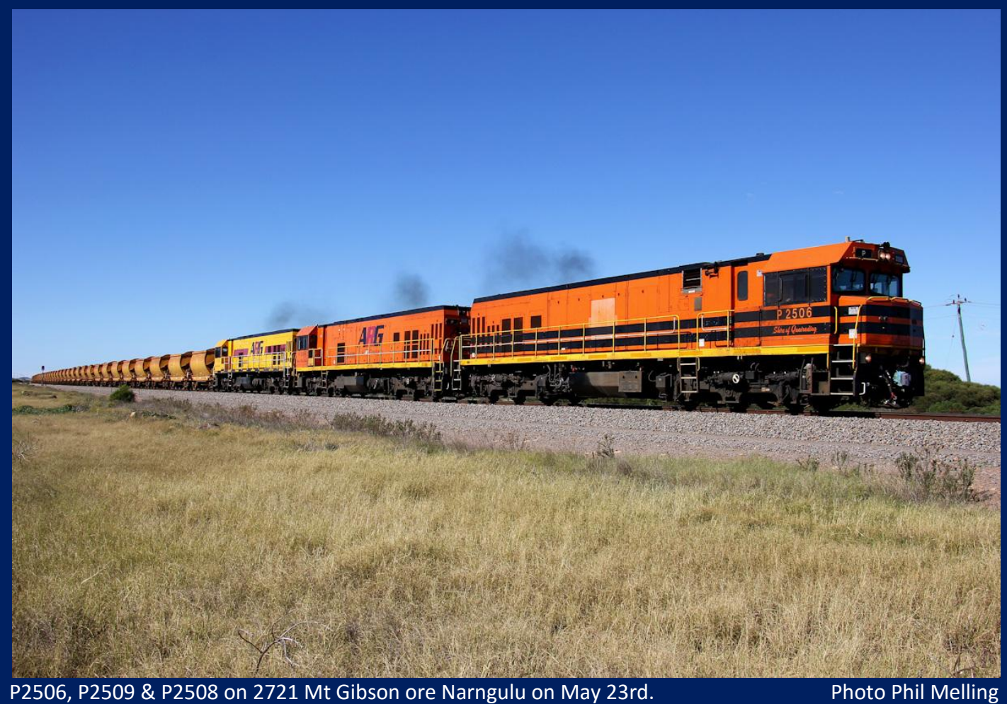
P2506, P2509 & P2508 on 2721 Mt Gibson ore Narngulu on May 23rd.