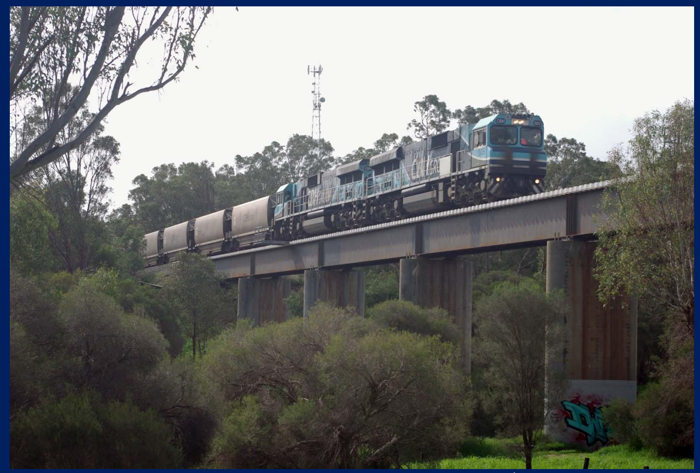
CBH005 & CBH007 on 6K54 Watco grain crossing Swan River at Upper Swan 29/4.