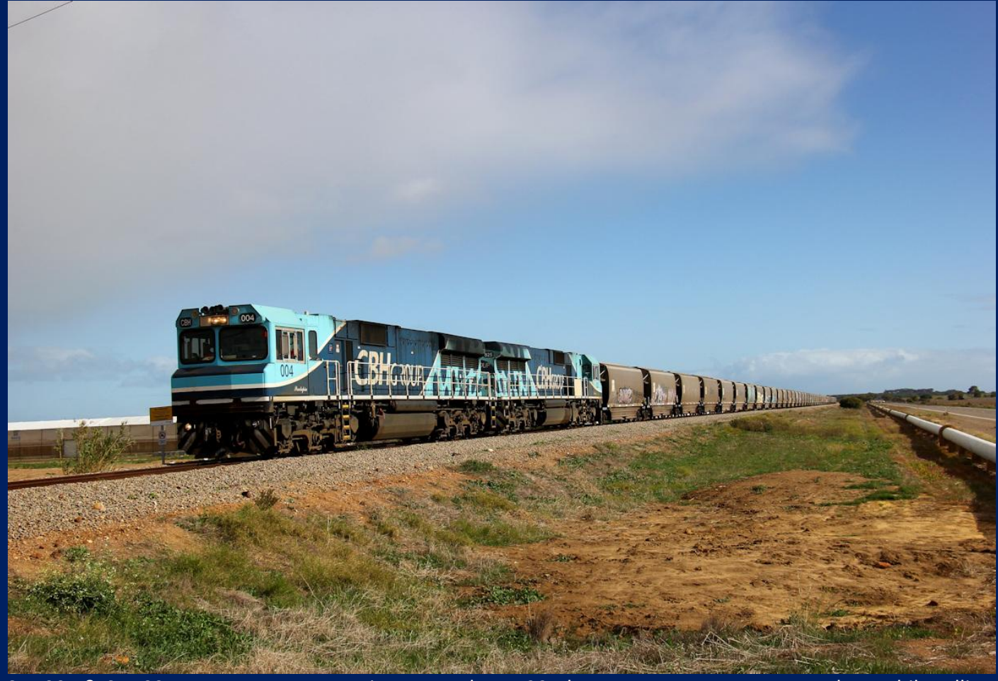
CBH004 & CBH025 on empty Watco grain Bootenal May 22nd.