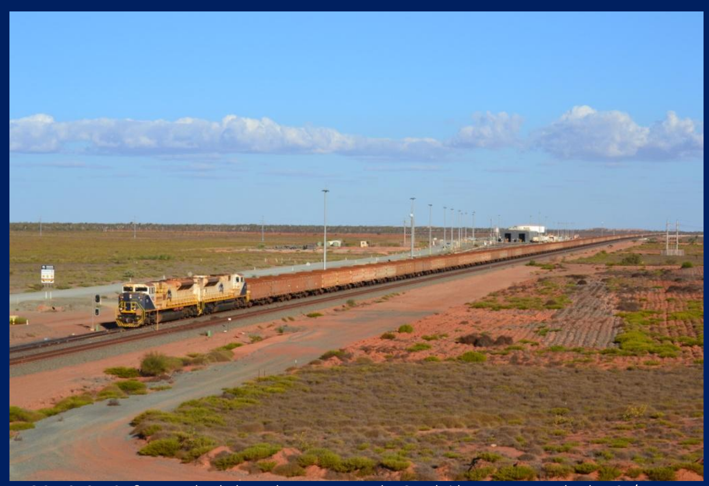
FMG SD70ACe 701 & 717 on loaded ore about to pass under GNH bridge on way to unloaders 24/5.