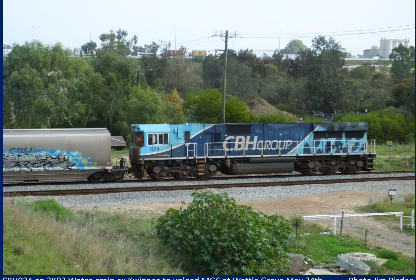
CBH024 on 3K03 Watco grain ex Kwinana to unload MGC at Wattle Grove May 24th.