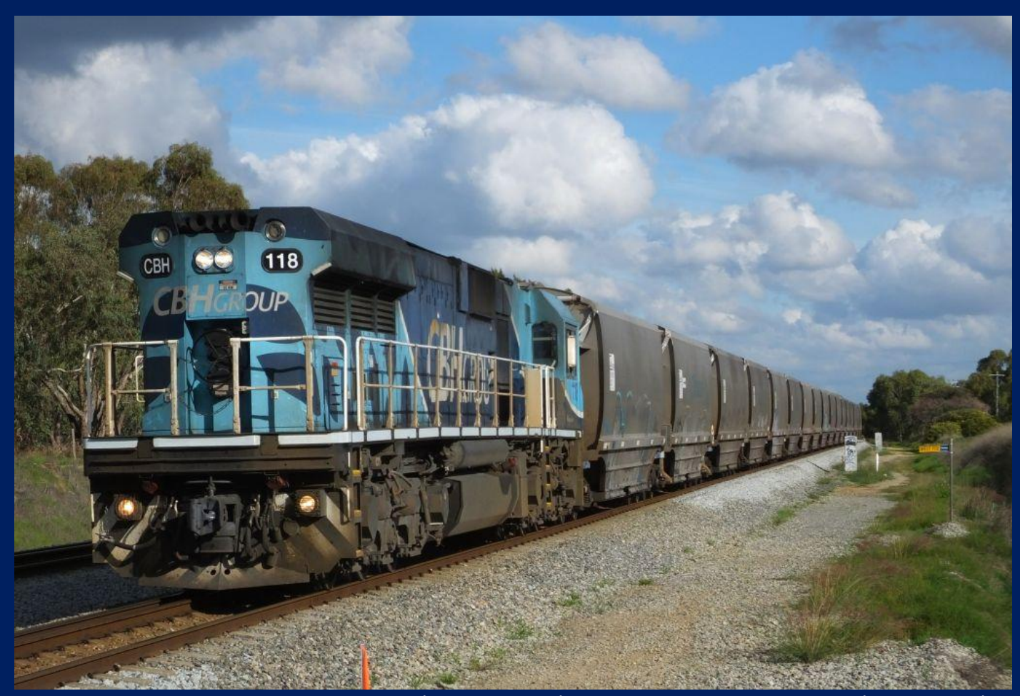
CBH118 on 6S59 empty Watco grain at Hazelmere May 20th.