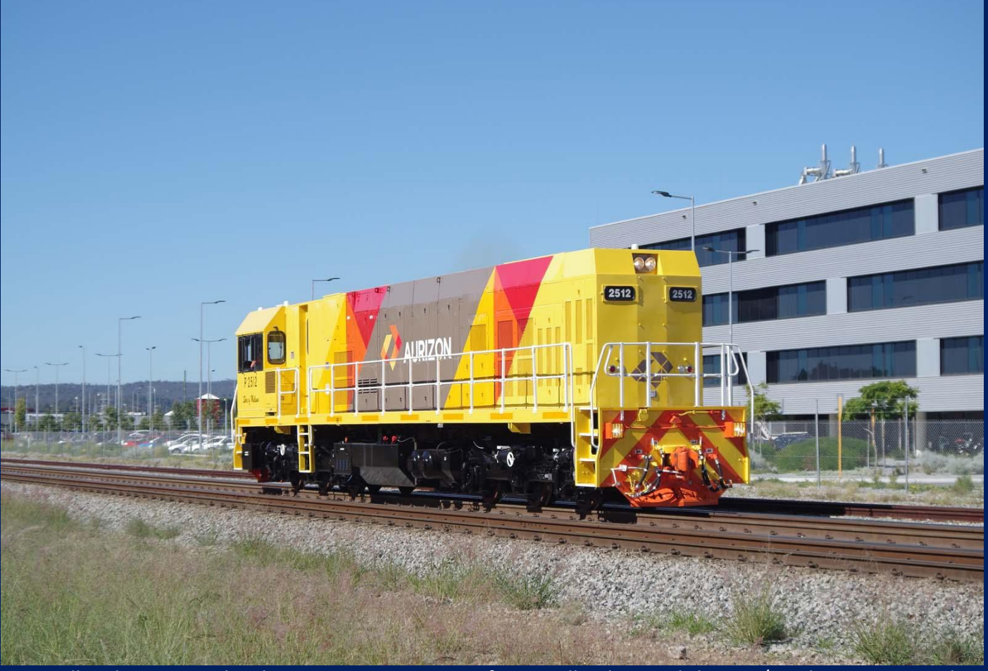
2512 still with P on its cab sides on 4124 engine train from Midland to workshop 11/5.