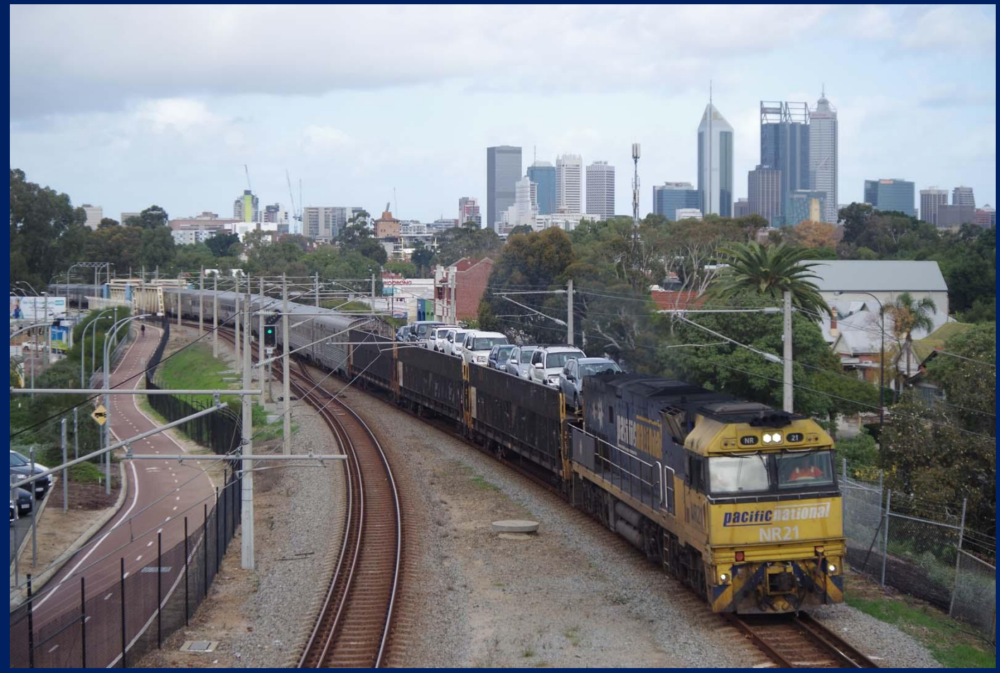
NR21 on 1PA8 Indian Pacific departing East Perth Terminal May 22nd.