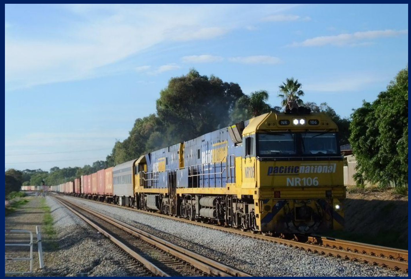
NR106 & NR2 on 6SP5 Perth Sydney intermodal at Hazelmere May 8th.