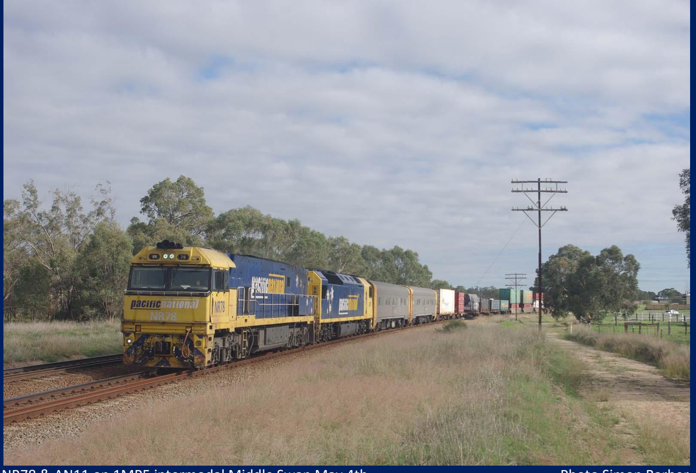
NR78 & AN11 on 1MP5 intermodal Middle Swan May 4th.