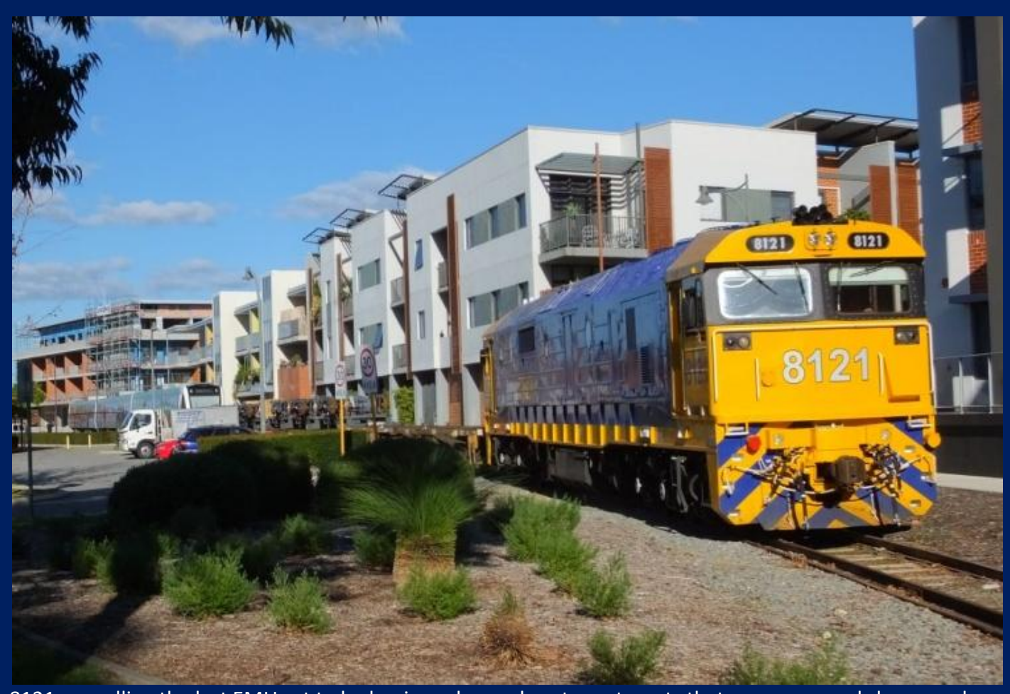
8121 propelling the last EMU set to be bogie exchanged past apartments that was once workshops yard .