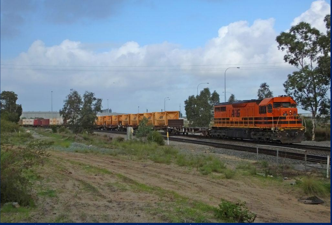
LZ3111 hauling failed 7426 Kwinana shunter back into Forrestfield yard May 22nd.