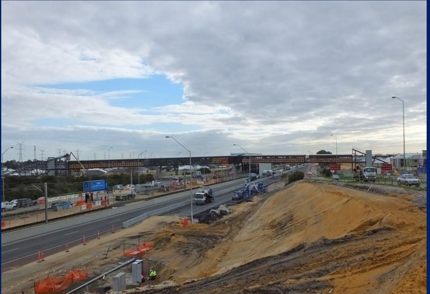
What a difference a couple weeks and modular construction makes new Aubin Grove Station on 24/6.