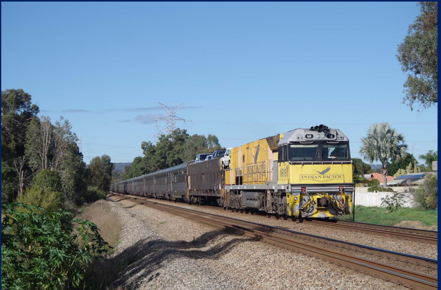
NR18 on 1PA8 Indian Pacific weekly interstate passenger train at Swan View May 29th.