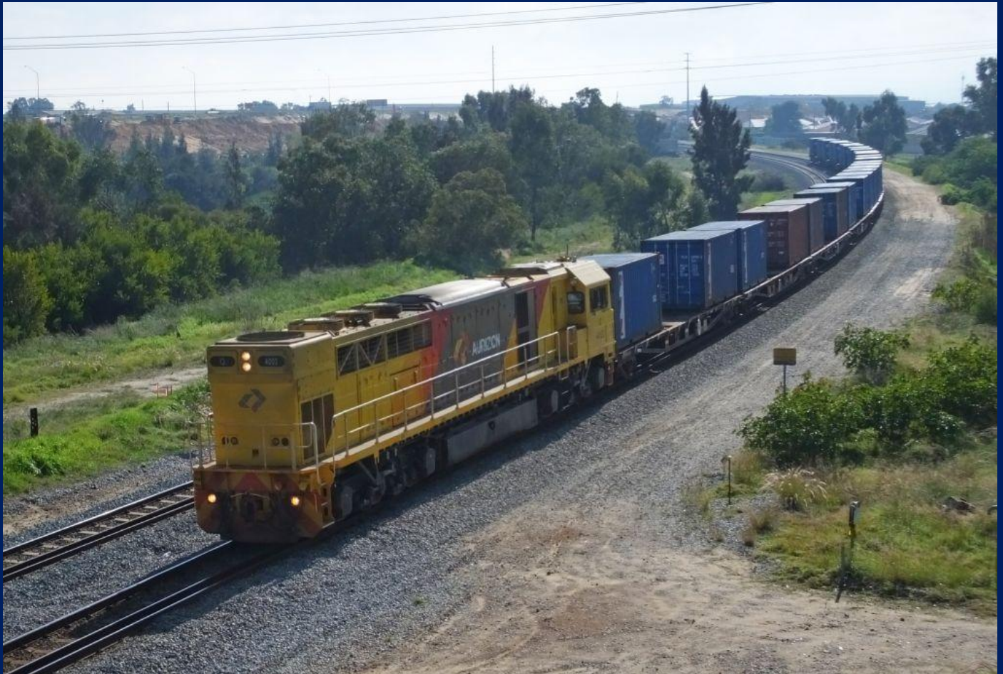
Q4002 on 4196 rare earths container train second train to North Port at Wattle Grove June 22nd.