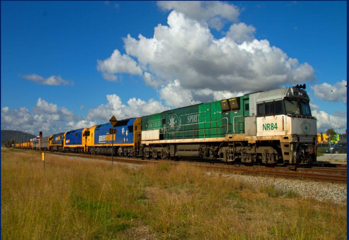
NR 84, AN6, 8121 & NR98 on 1MP2 combined steel and intermodal at Midland 28/6.