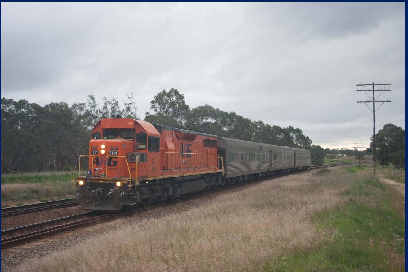
LZ3114 on 1AK2 AK car track inspection train Middle Swan June 19th.