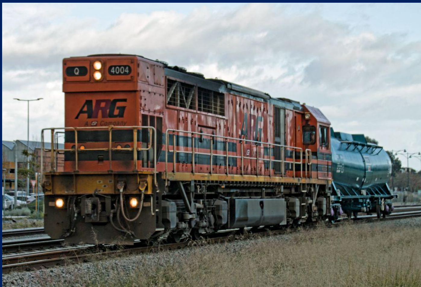
Q4004 on 3113 Caltex tanker CX3358 speed trial to Hines Hill at Midland 28/6.