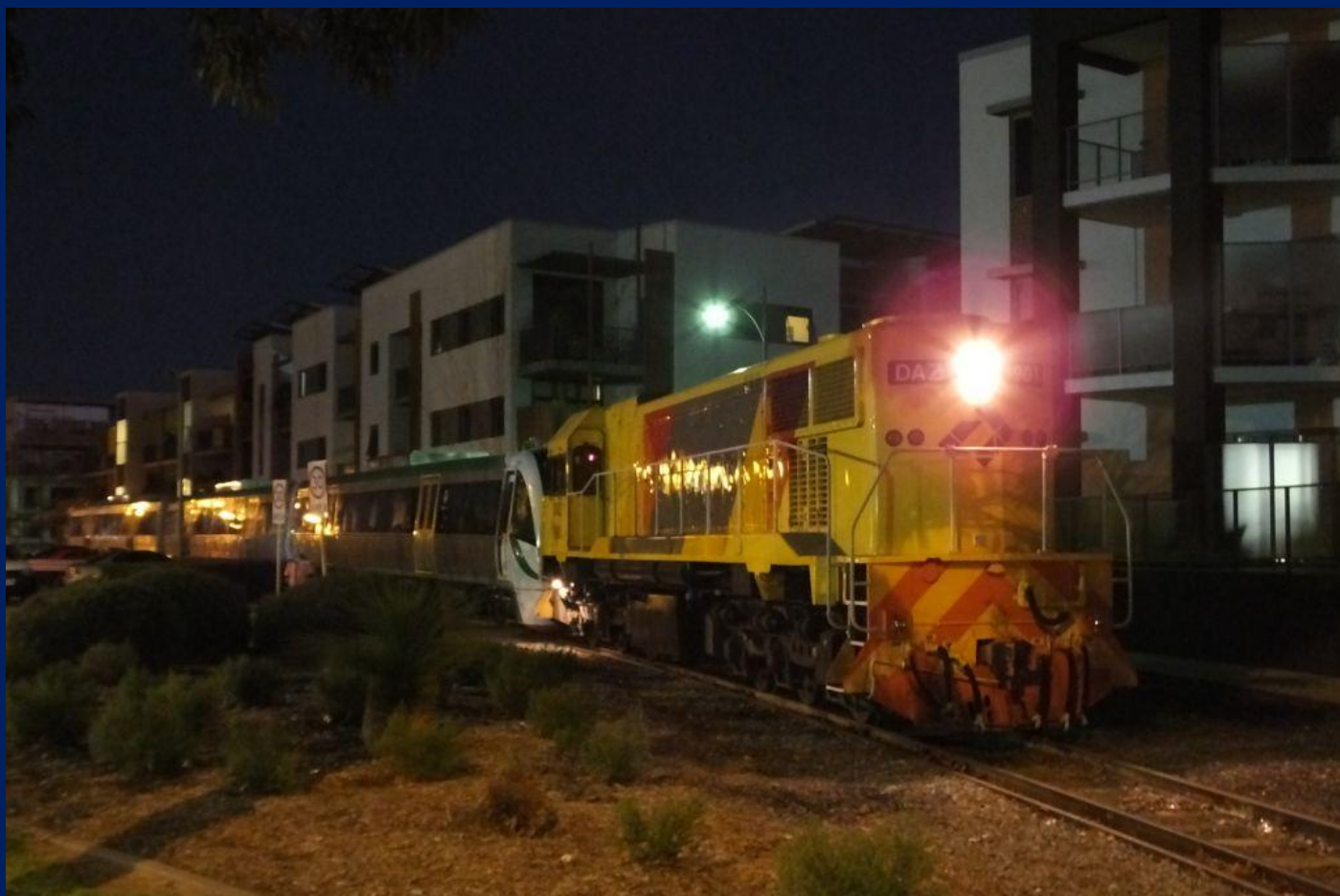
DAZ1901 in darkness hauls EMU set 116 past the residential developments that was once the Midland Workshops Yard as they depart the old railway workshops for the last time 17/6.