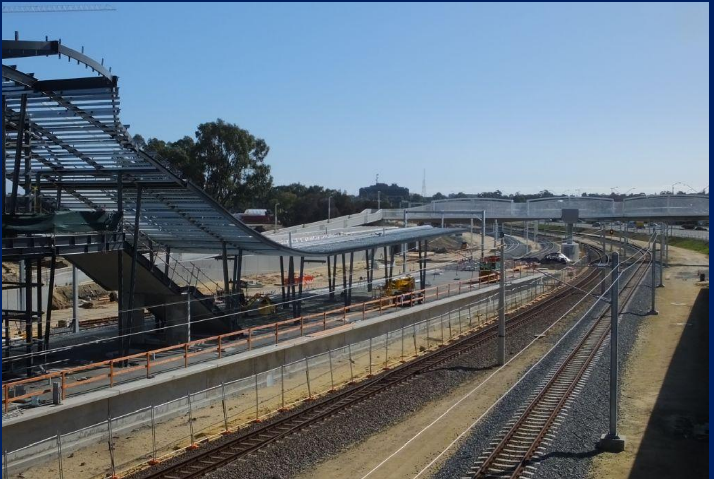
New Stadium Station under construction looking north June 26th.