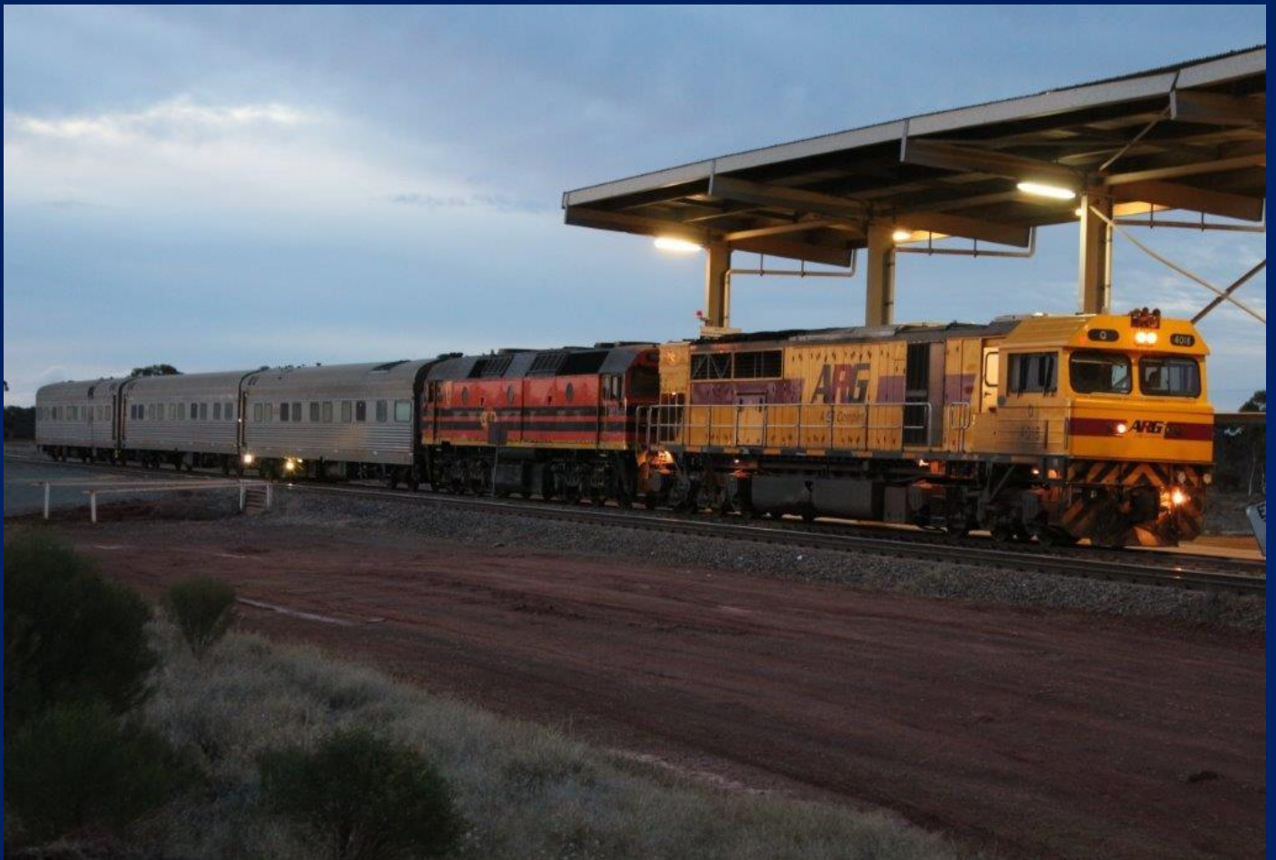
Q4018 on 3AK3 shunts 2210 AK inspection train into Engineers siding Parkston 21/6.