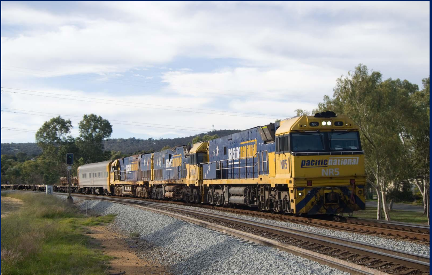
NR5 hauling damaged NR5 & NR50 on 7008 recovery train thru Bellevue June 12th.