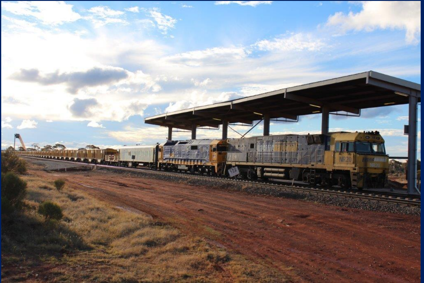
NR20 & 8121 on 3PM4 with empty ballast rake it had just attached at Parkeston 21/6.