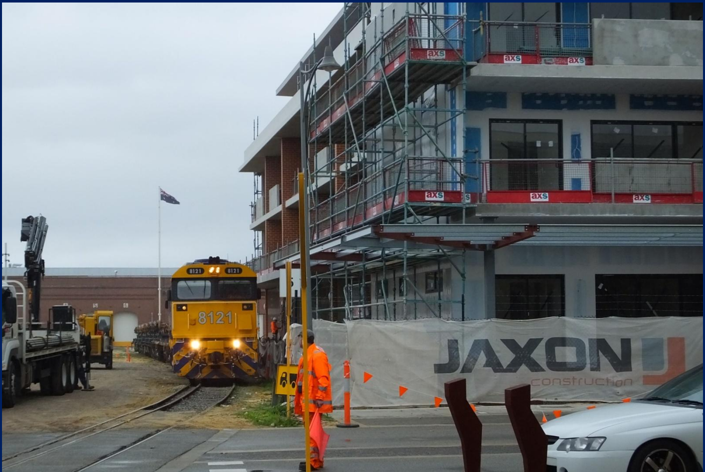
8121 hauls 6P32 transfer bogies on flattops out of old workshops Midland yard for last time passing the apartment block under construction that will be part of new Midland Square development June 10th.