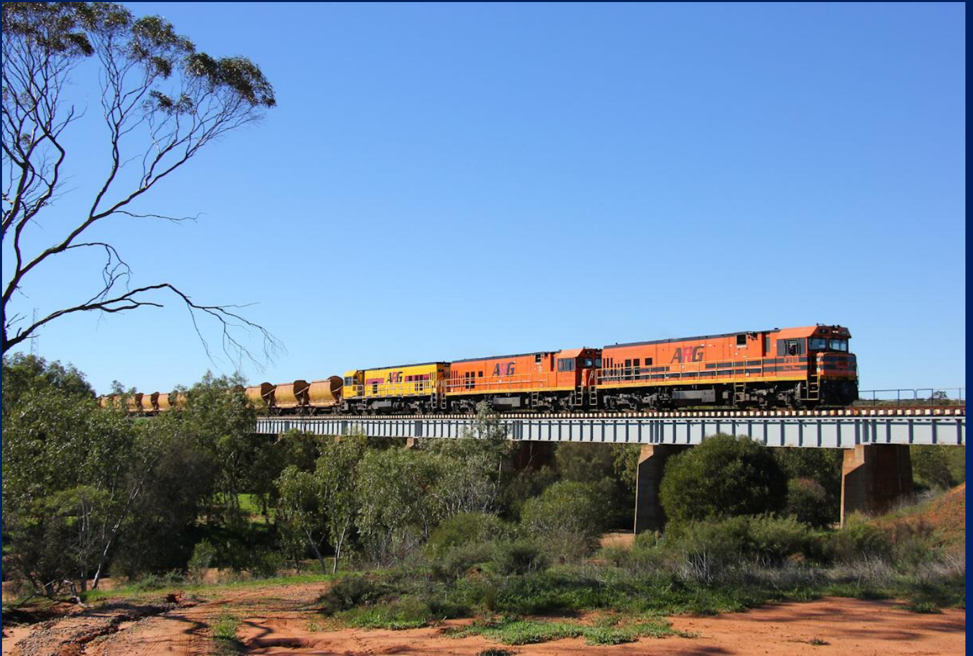
P2513, P2509 & P2501 on 7721 Mt Gibson ore crossing Greenough River Eradu on 18/6.