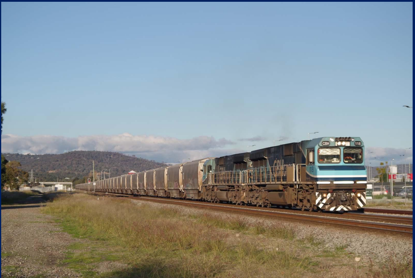
CBH118 & CBH121 on 6S56 Watco grain at Midland June 17th.