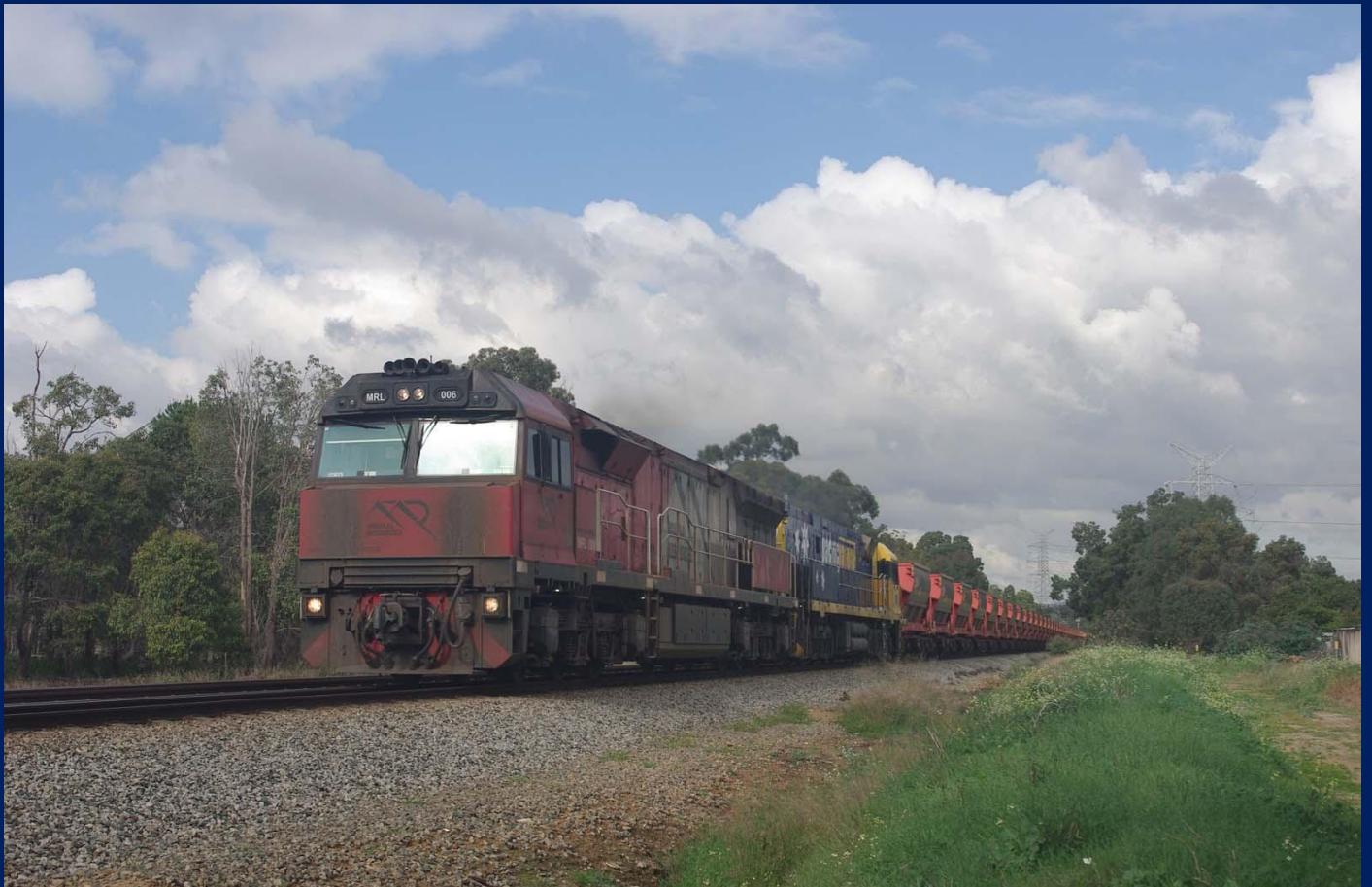
MRL006 & NR1 on 4033 empty Polaris ore Swan View June 22nd.