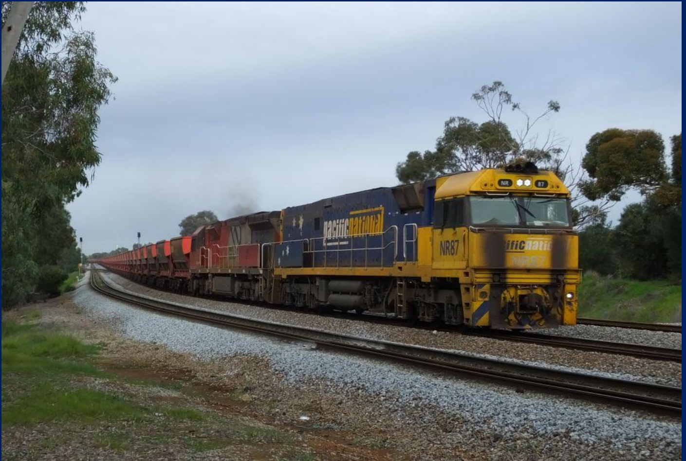
NR87 & MRL006 on 5033 empty Polaris ore at Woodbridge June 9th.