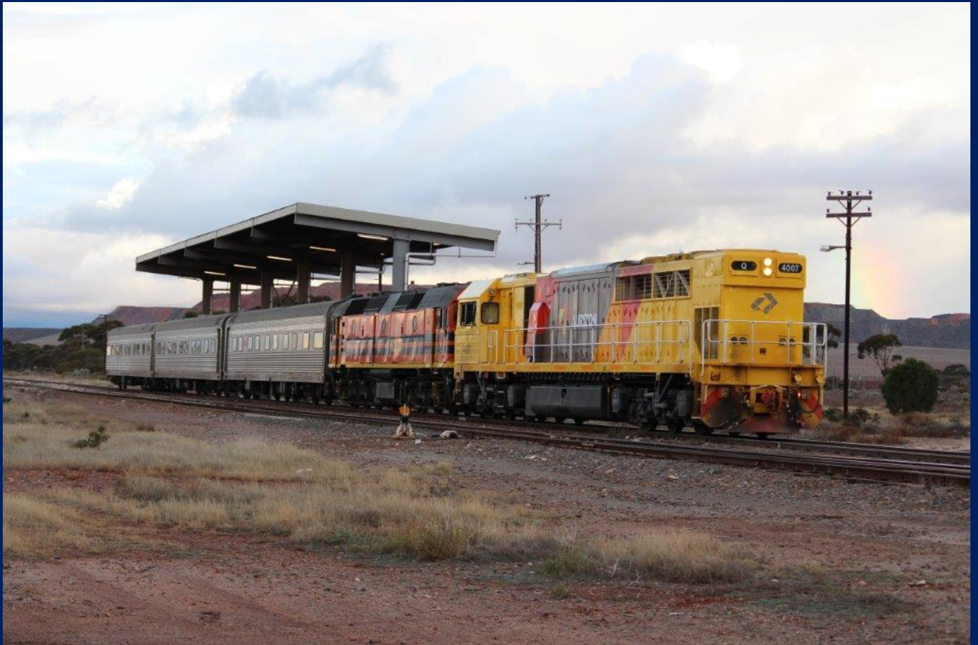
Q4007 with GWA2210 and AK inspection train at Parkeston June 14th.