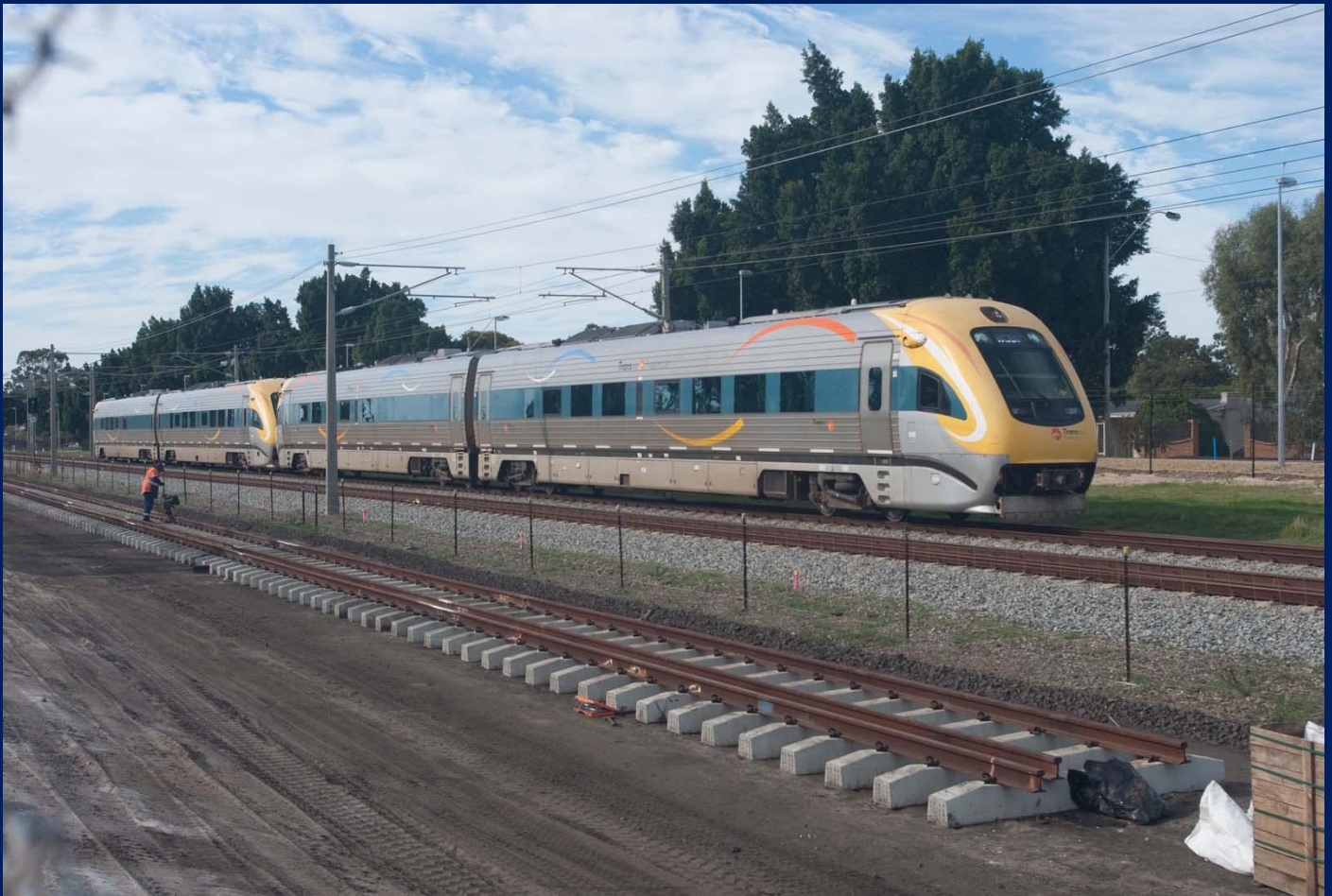
Four car Prospector service 6484 from Kalgoorlie passes new PTA siding Ashfield 3/6.