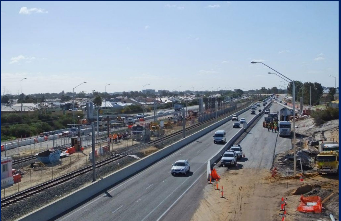
Aubin Grove Station under construction in centre of Kwinana Freeway June 8th.