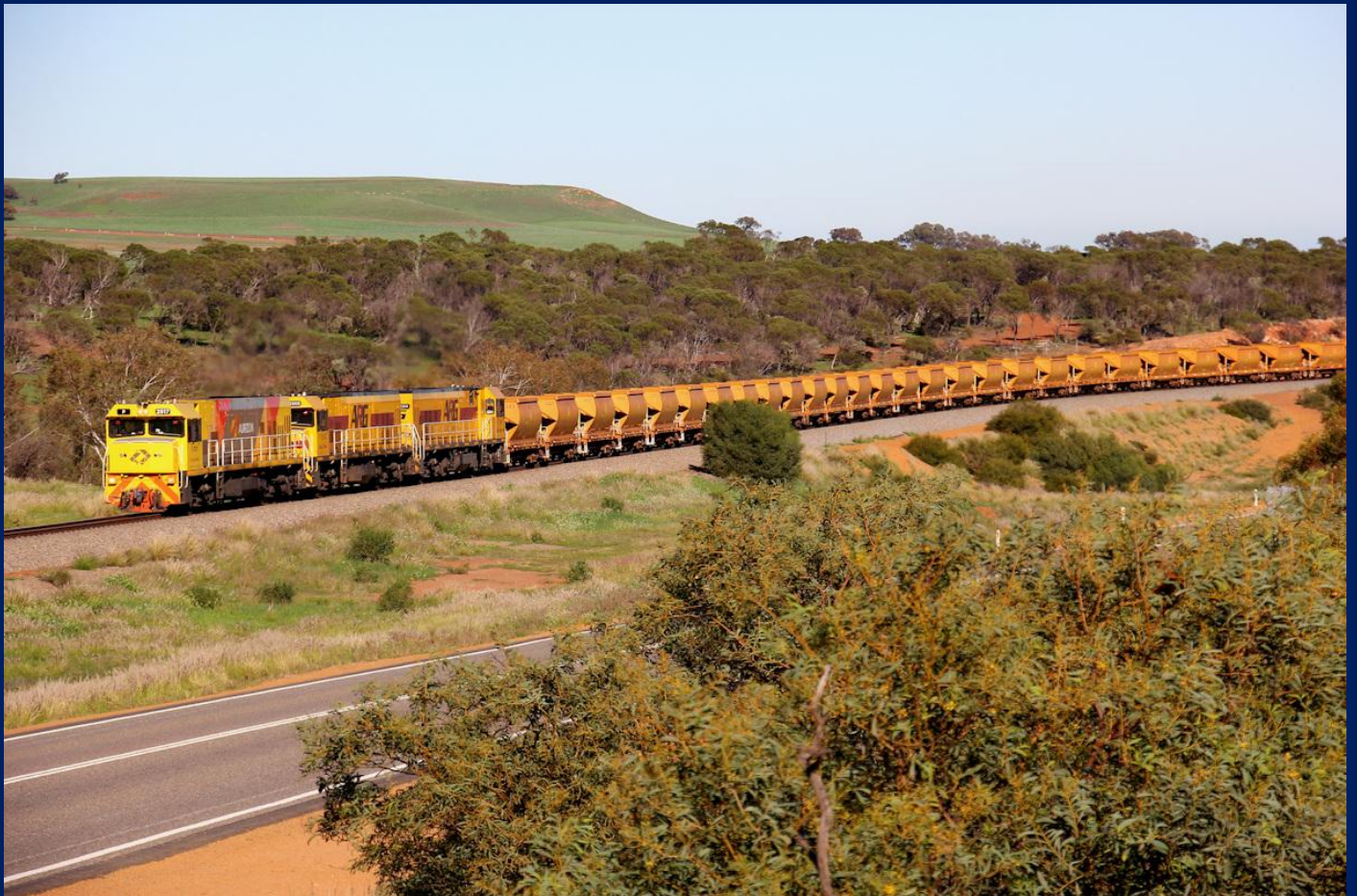
P2517, P2502 & P2514 on 7720 empty Mt Gibson ore thru old Grants June 18th.