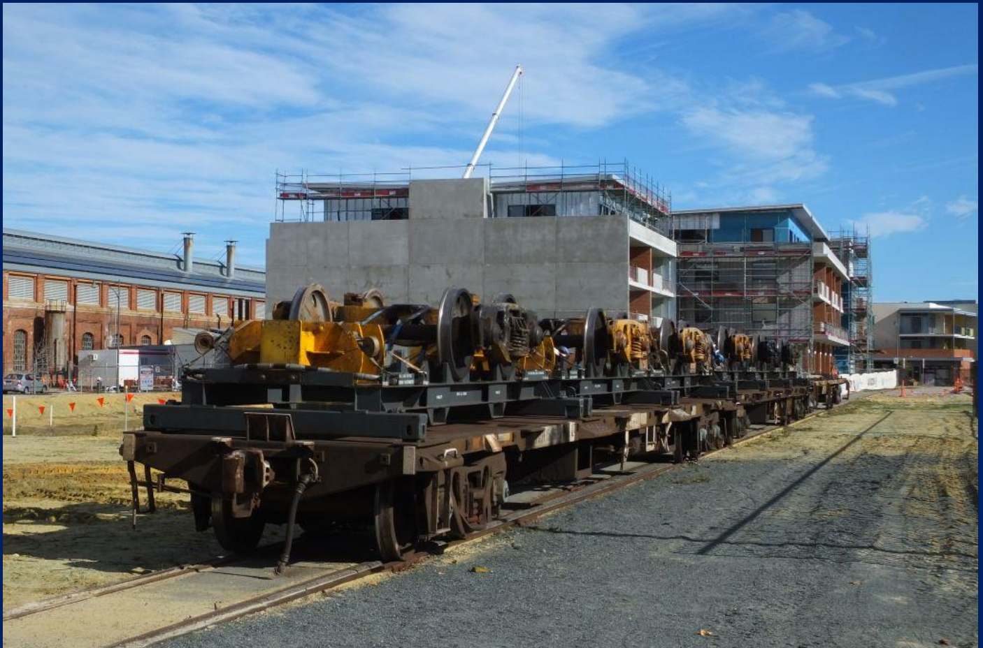
Last freight loading in old Midland workshops yard transfer bogies awaiting collection 3/6.