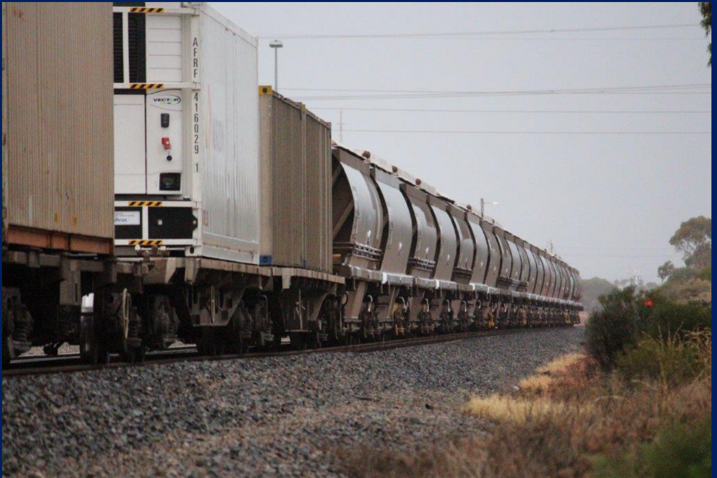
21 AGUY ex narrow gauge grain wagons bound for NSW on rear 7PM1 at WEK 4/6.