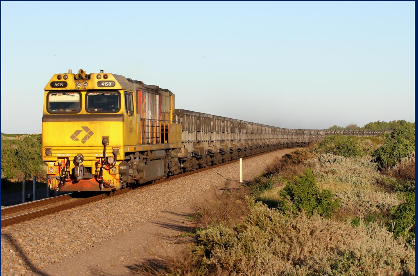
ACN4150 on 7762 empty Karara ore train at Mahomets Flats June 18th.