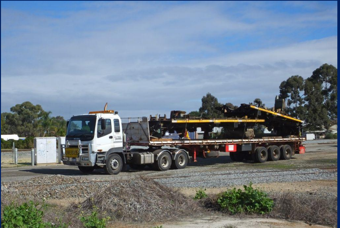
Frame of once preserved R1902 hauled away to scrap at Bellevue June 9th.