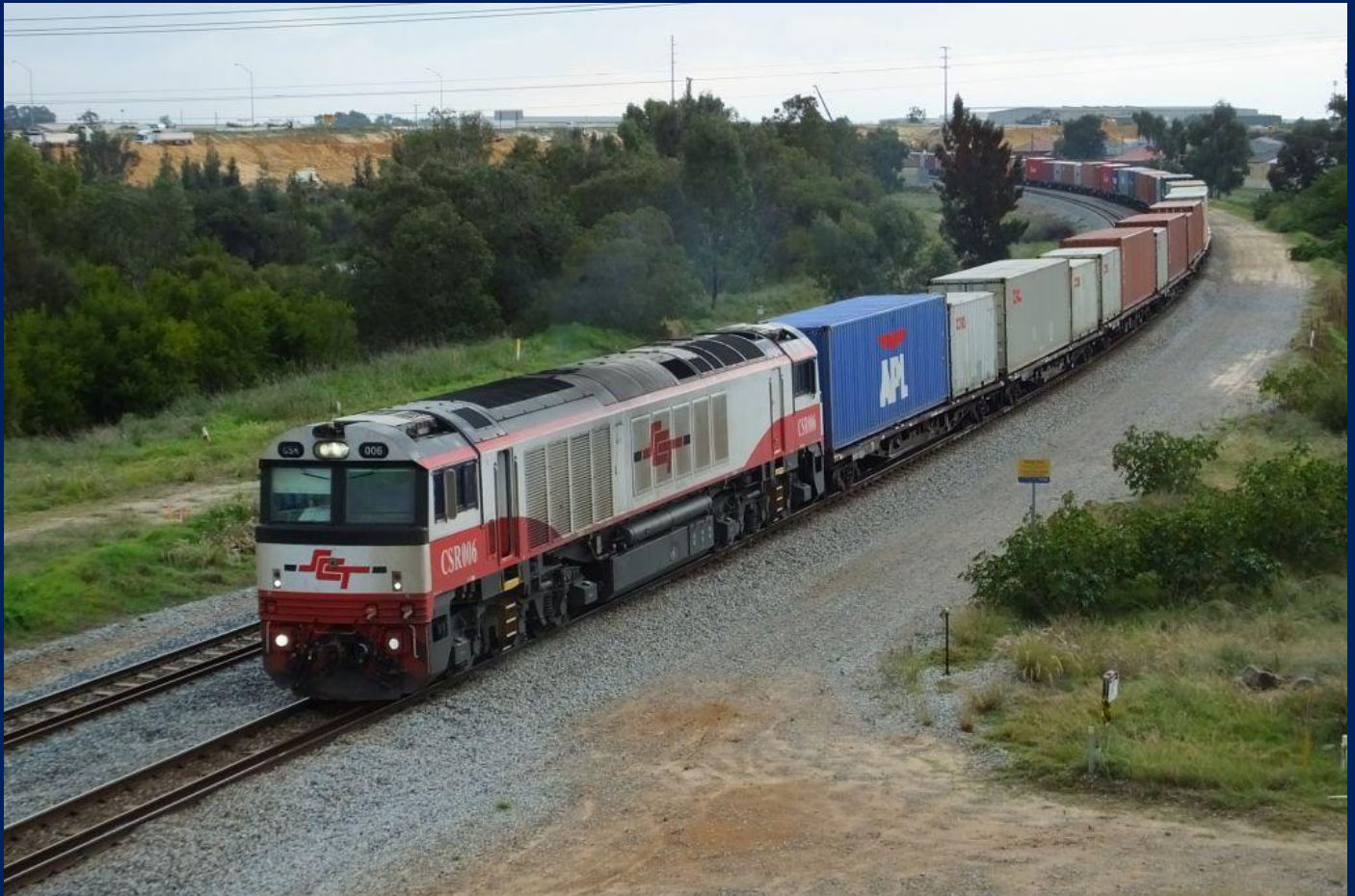
CSR006 runs 4142 ILS/SCT port shuttle intermodal thru Wattle Grove June 22nd.