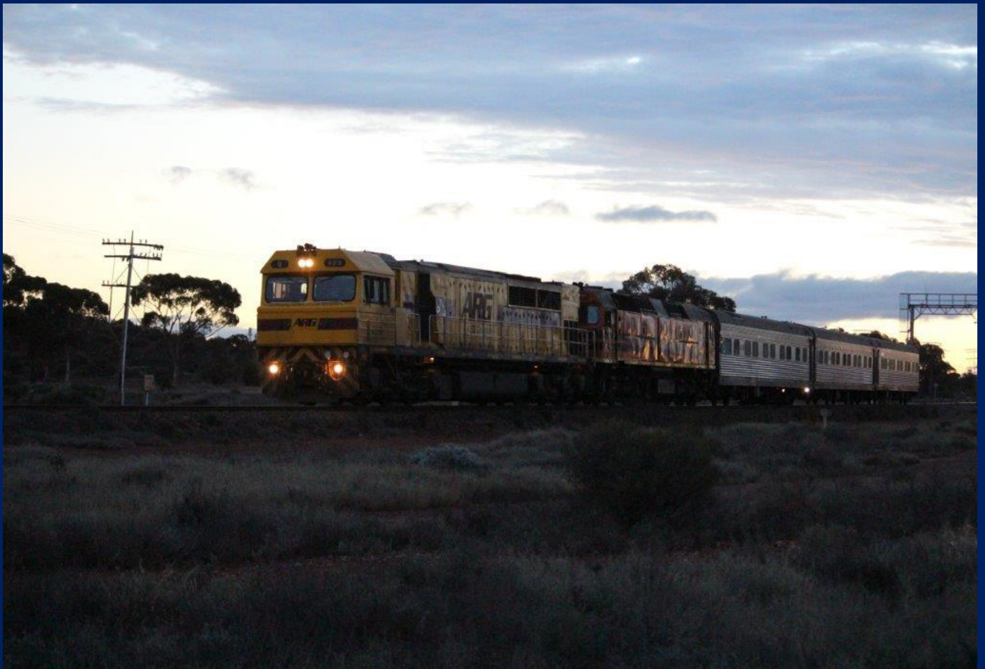
Q4018 on 3AK3 hauling GWA2210 and AK inspection cars Parkeston June 21st.