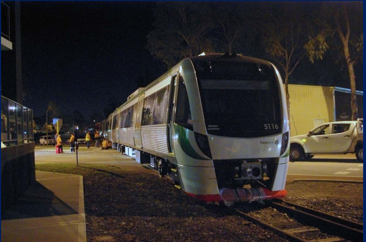
EMU set 116 was help up over Yelverton Street as footpath was out of gauge 17/6.