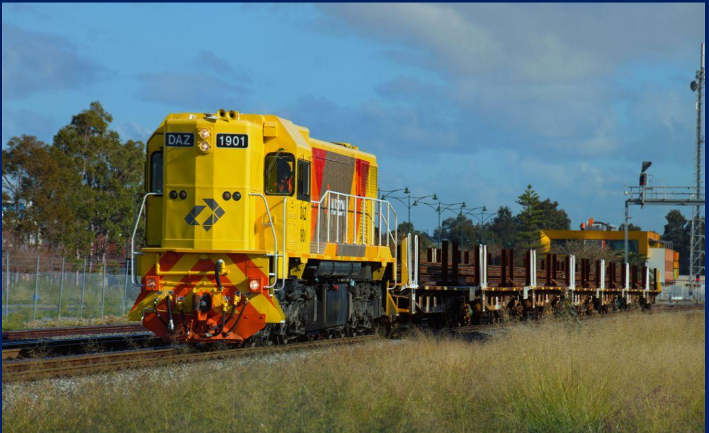
DAZ1901 the last of its class left works 3RT1 rail train that's departing dual gauge loop Midland crossing over onto main line after propelling back into it from flashbutt rail yard June 28th.