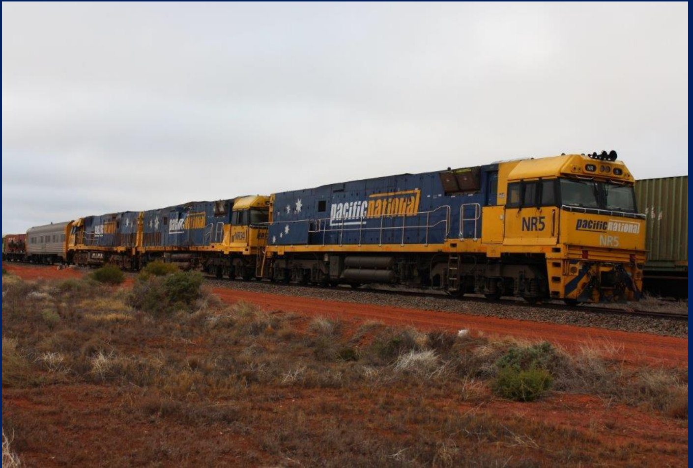
NR5 with damaged NR34 and NR50 on 7008 locomotive recovery train at Parkeston June 11th.