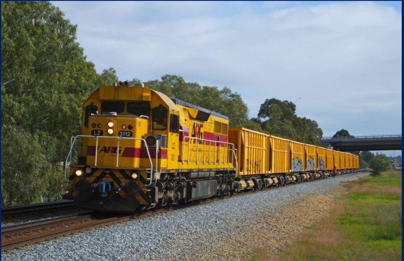
LZ3112 on 5BT1 first mainline run after return to service ballasting at Bellevue 9/6.