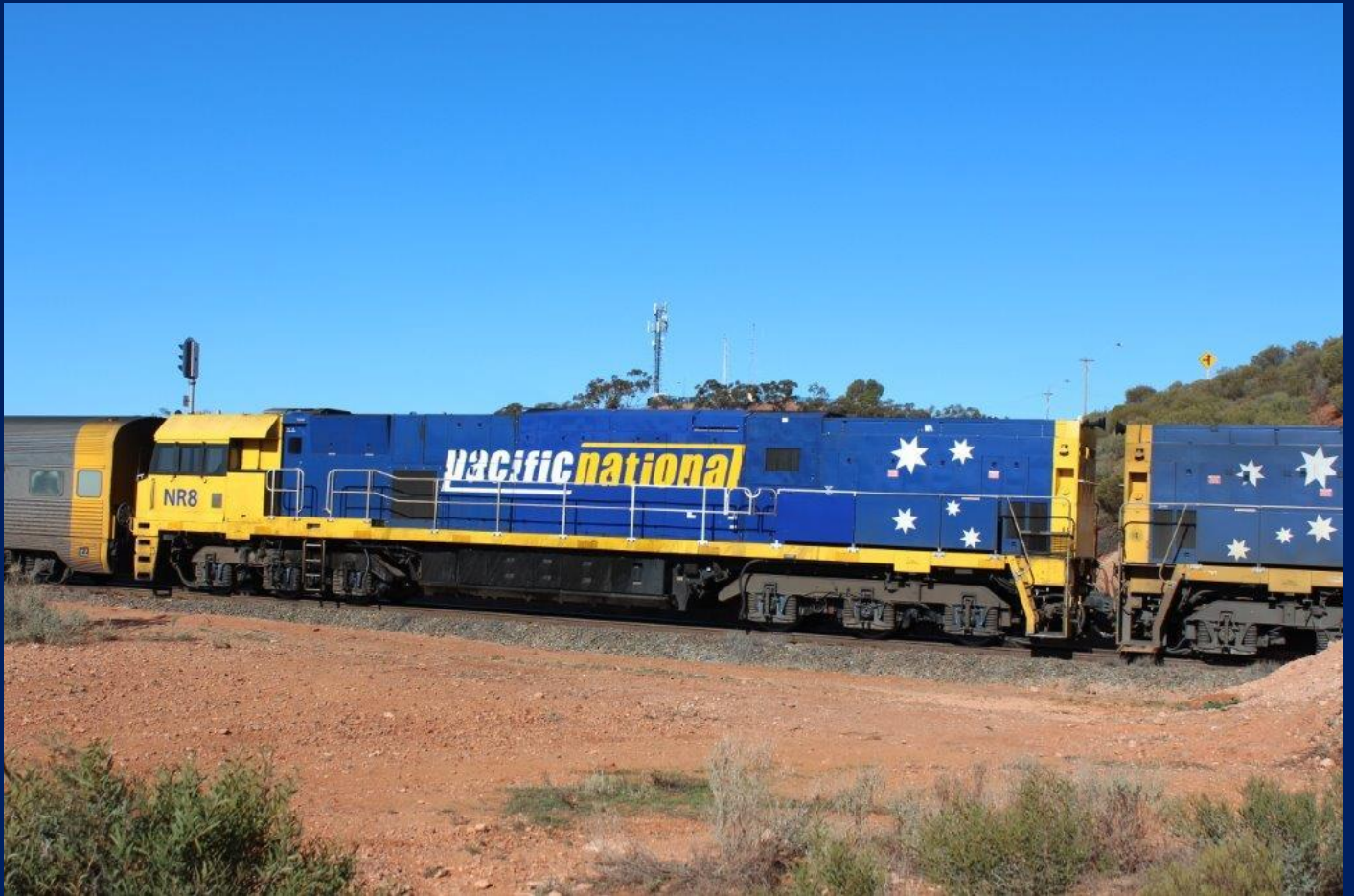
NR108 repaired and repainted at Spotswood following engine fire Kalgoorlie 26/6.