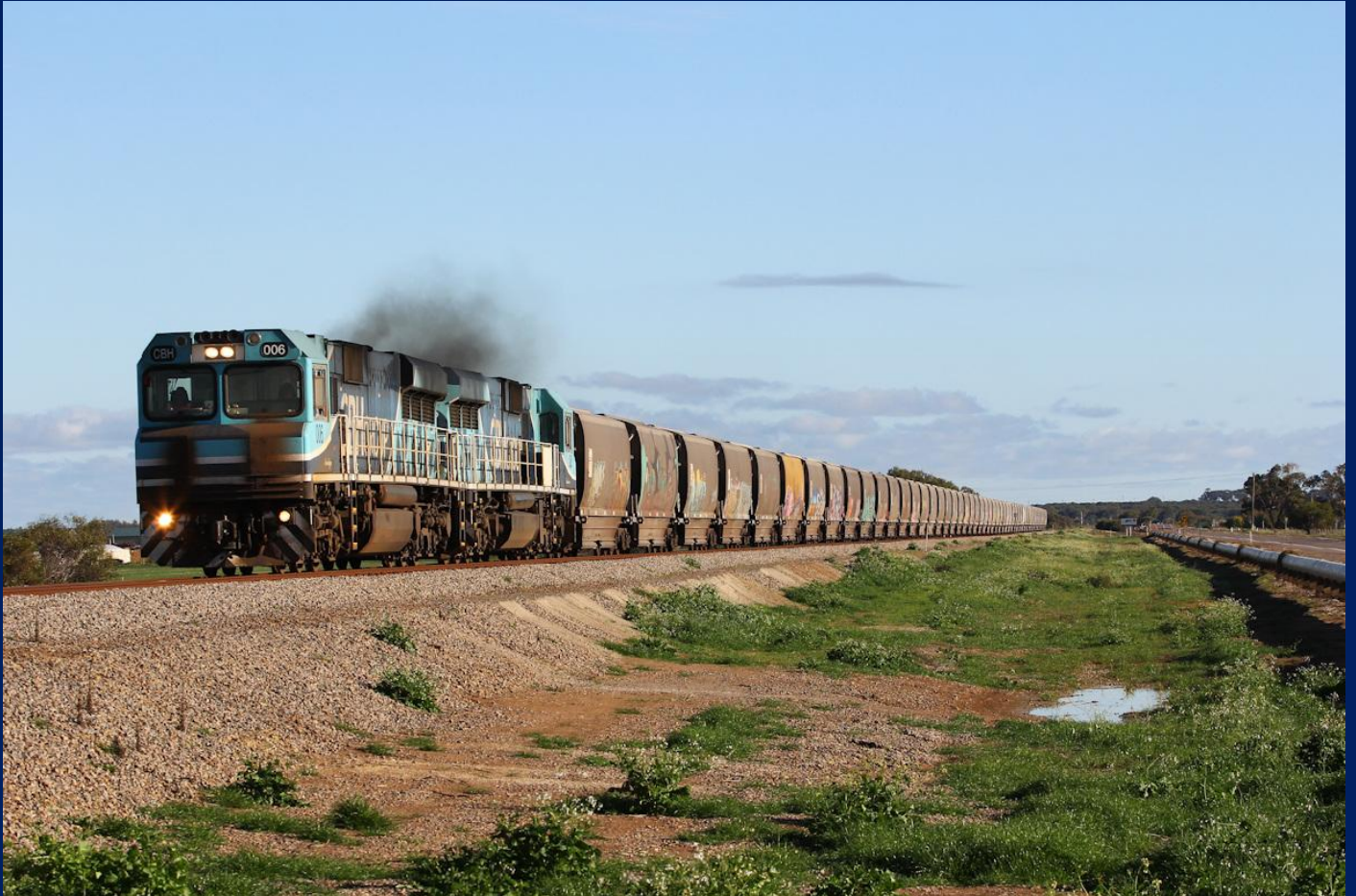
CBH006 & CBH008 on 1G50 empty Watco grain runs through Georgina June 19th.