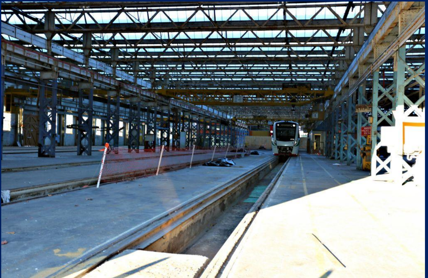
EMU set 116 last one converted old Midland workshops waits collection 17/6.