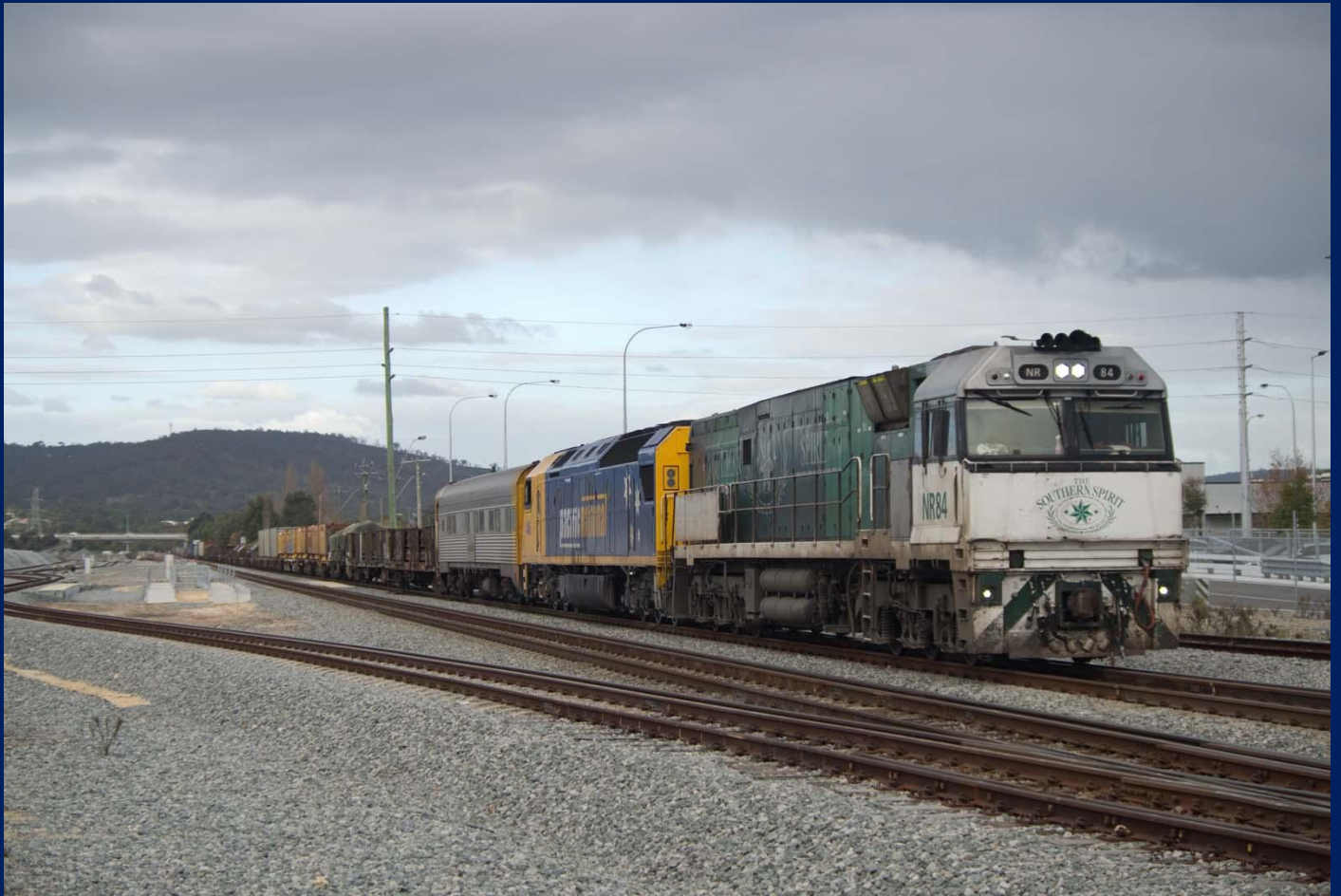
NR84 & AN6 on 1MP2 crossing Lloyd Street underpass Midland June 22nd.