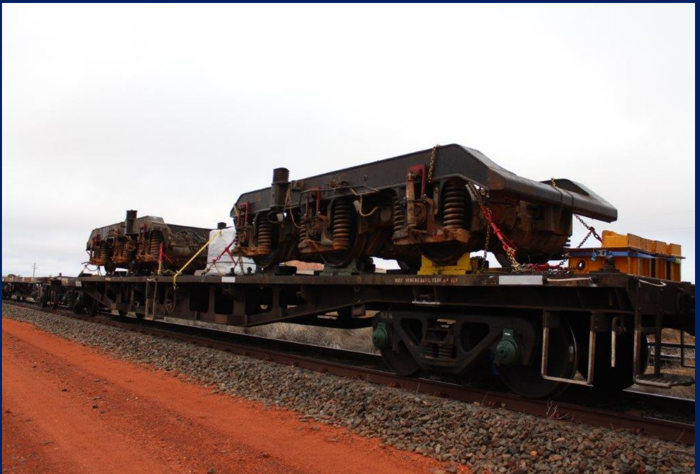
NR50 damaged bogies from Rawlinna derailment on flattop wagon at Parkeston being hauled on 7008 recovery train to Kewdale and eventual return of bogies interstate for repair 11/6.