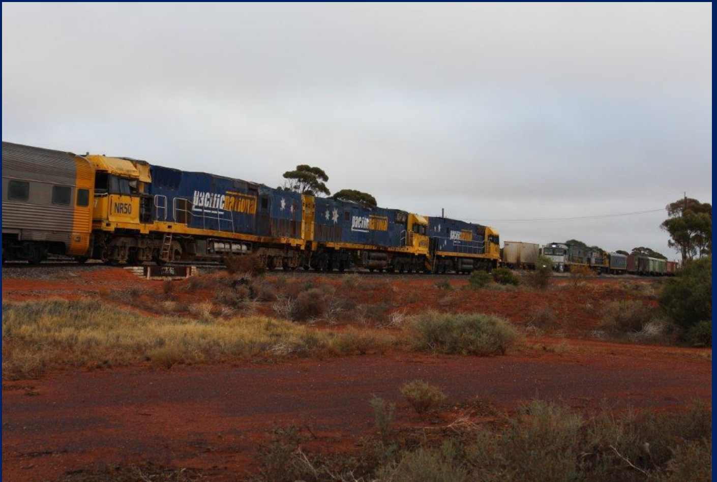
NR50 and NR34 from Rawlinna derailment at Parkeston crossing NR85 & NR37.