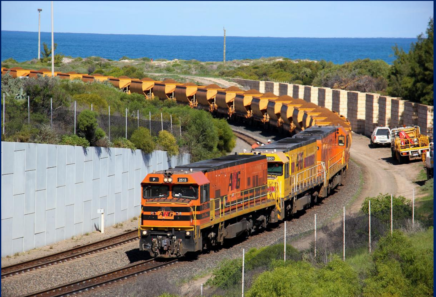
P2513, P2501 & P2509 on 5721 Mt Gibson ore entering Geraldton Port Karara line 9/6.