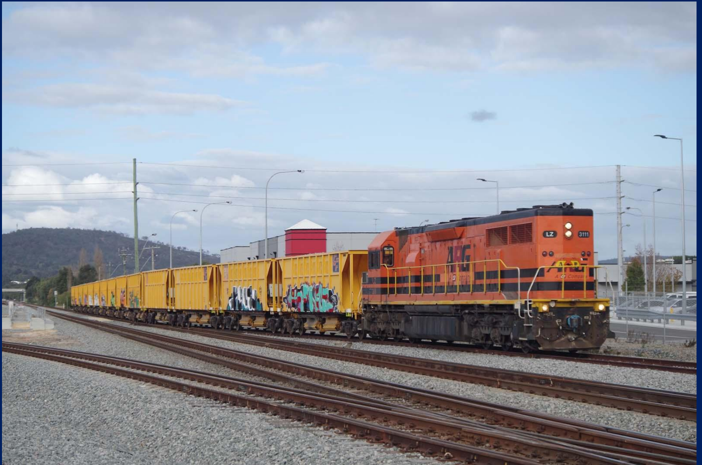
LZ3111 on 4BT2 empty ballast entering dual gauge Midland loop June 22nd.