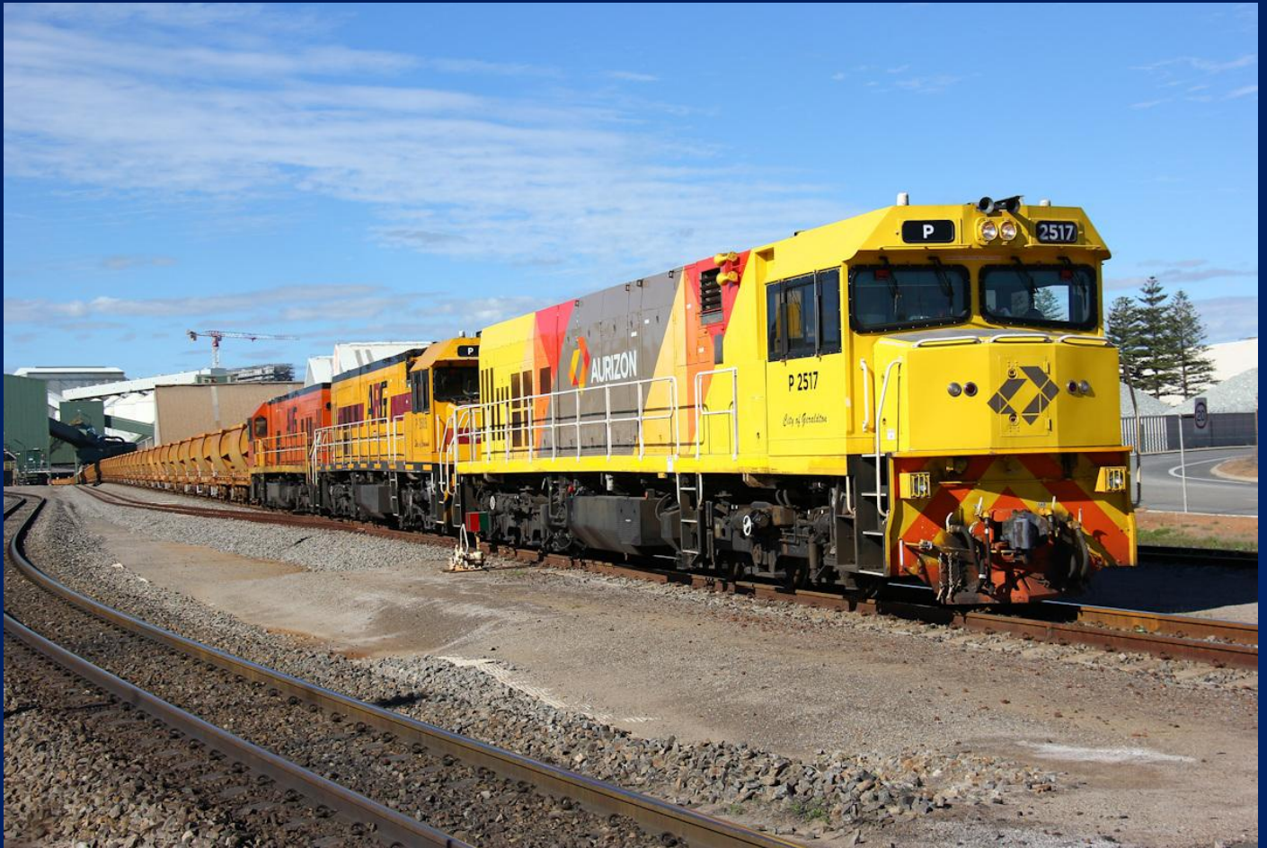
P2517, P2508 & P2509 on 2722 empty Mt Gibson ore Geraldton Port June 27th.