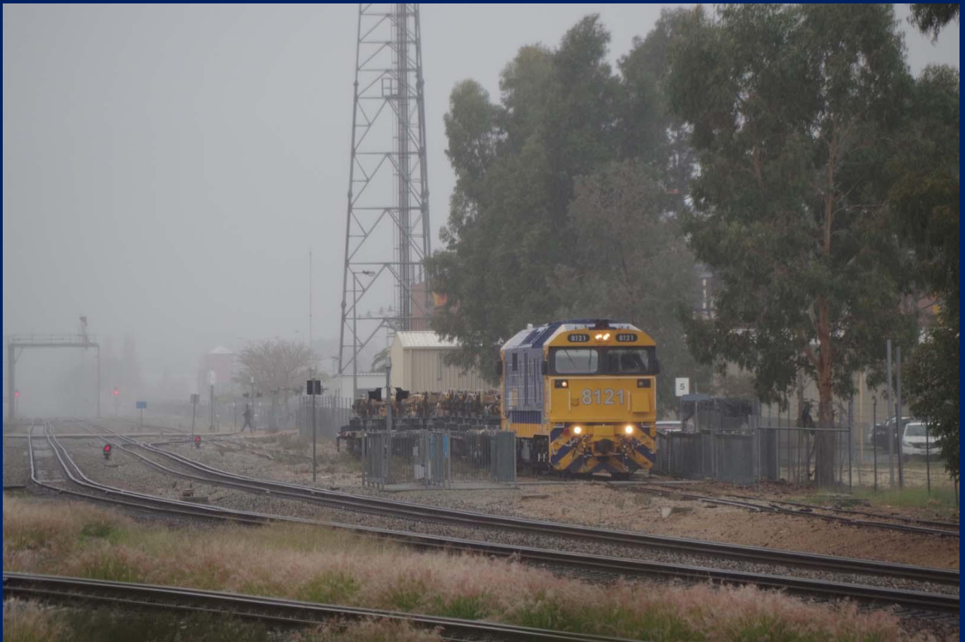
8121 on 6P32 propelling transfer bogies on flattops from old workshops dead end to Midland loop 10/6.