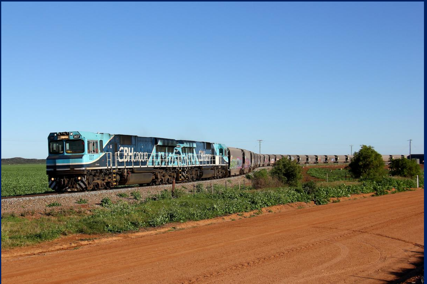
CBH007 & CBH004 on 7G50 empty Watco grain to Mingenew running thru Crampton June 18th.