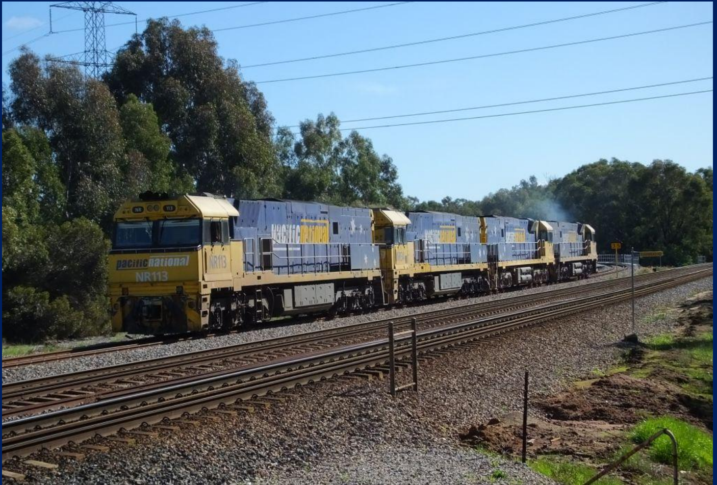
NR90 hauling un-braked NR50 & NR34 with manned NR113 for braking on way to UGL Bassendean 13/6.