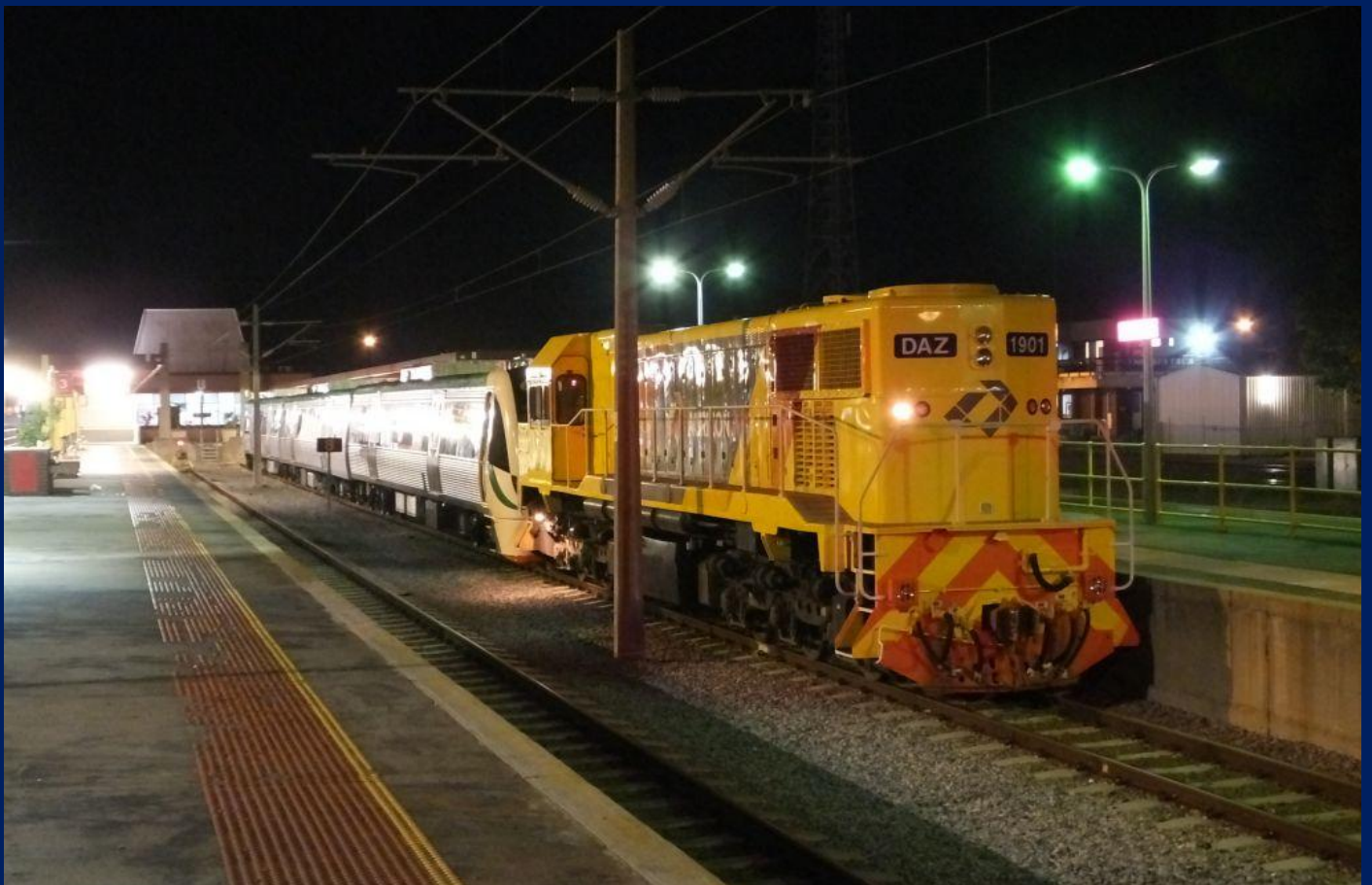
DAZ1901 having just propelled EMU set 116 into platform 2 at Midland Station to await collection by EMU to haul it to Nowergup late at night on June 17th.