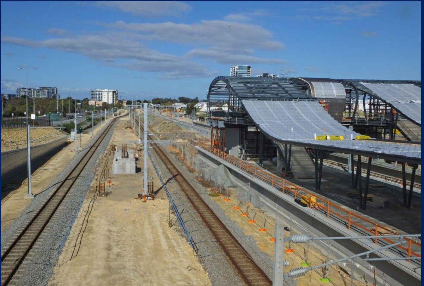
New stadium Station under construction at Burswood looking south on June 26th.