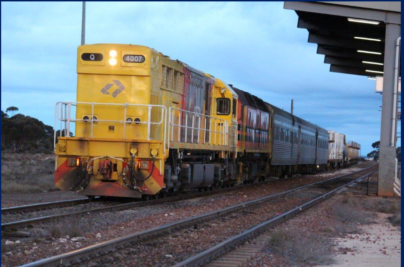
Q4007 hauls GWA2210 AK car inspection train and lime loading ex Parkeston 14/6.