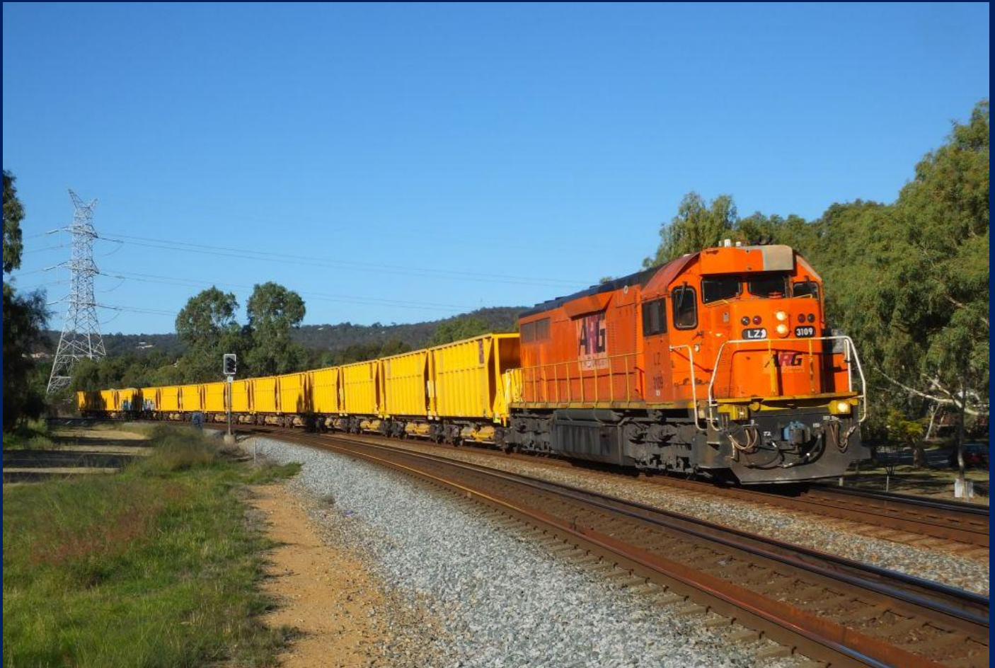
LZ3109 on 4BT2 empty ballast at Bellevue returning to ballast siding Midland 1/6.