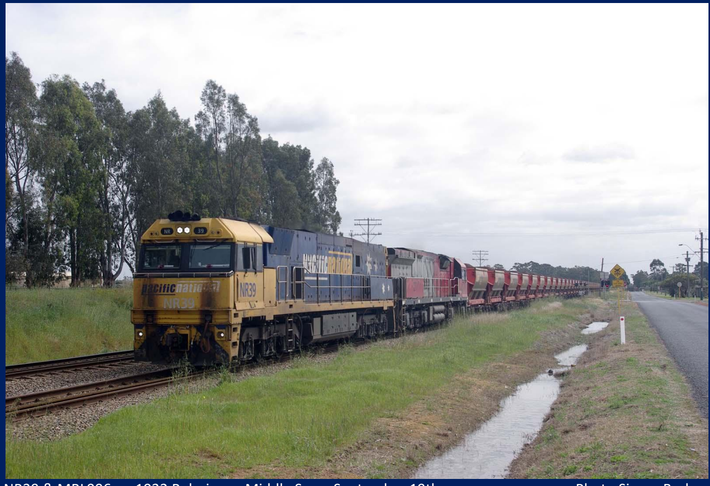
NR39 & MRL006 on 1032 Polaris ore Middle Swan September 19th.