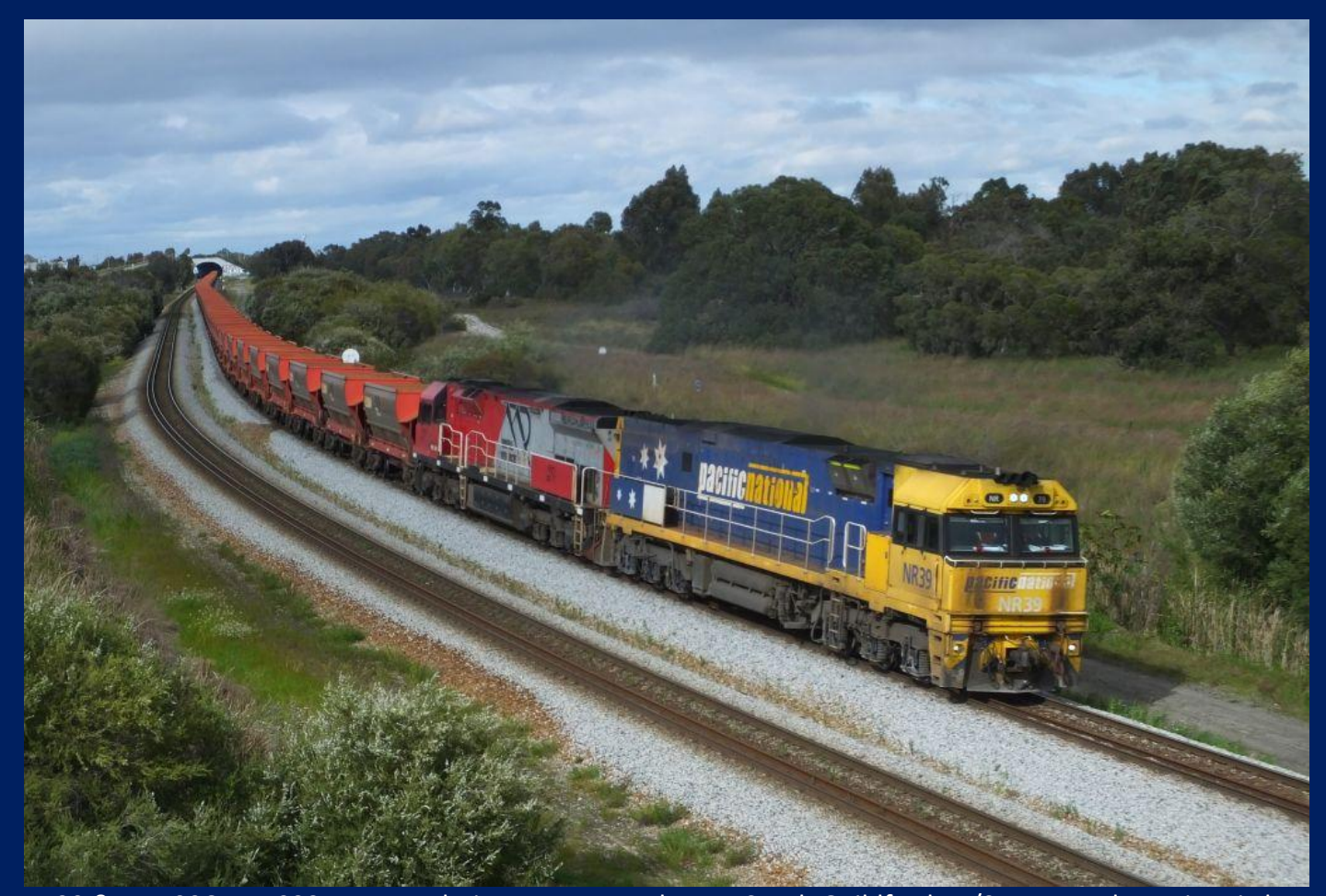
NR39 & MRL006 on 1033 empty Polaris ore to Mt Walton at South Guildford 11/9.