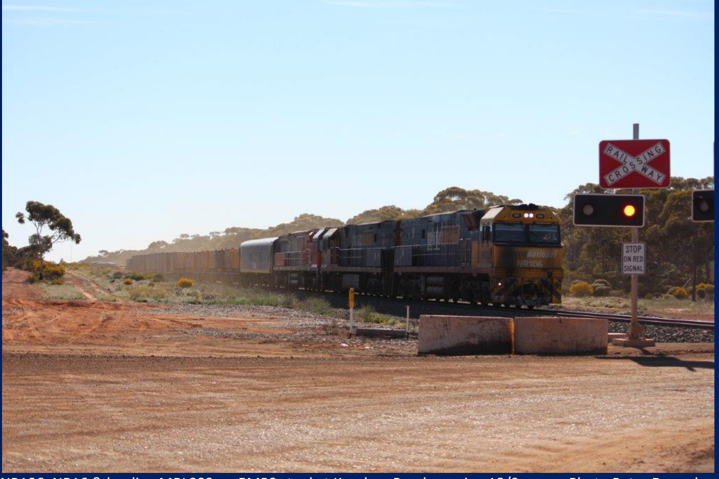
NR106, NR16 & hauling MRL003 on 5MP2 steel at Kundara Road crossing 18/9.