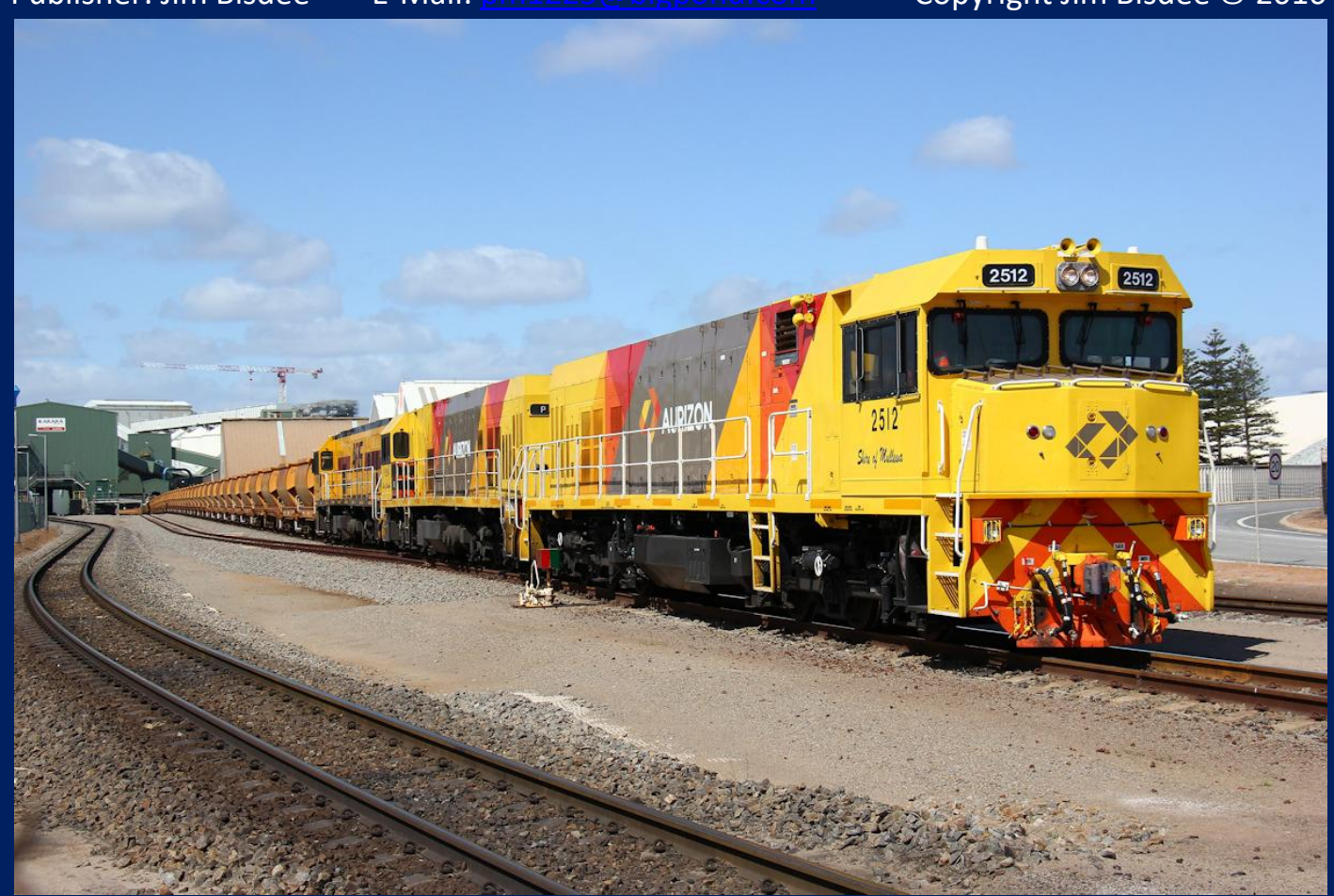
2512, P2504 & P2508 unloading 2722 Mt Gibson ore Geraldton Port September 19th.

Publisher: Jim Bisdee E-Mail: pm1225@bigpond.com