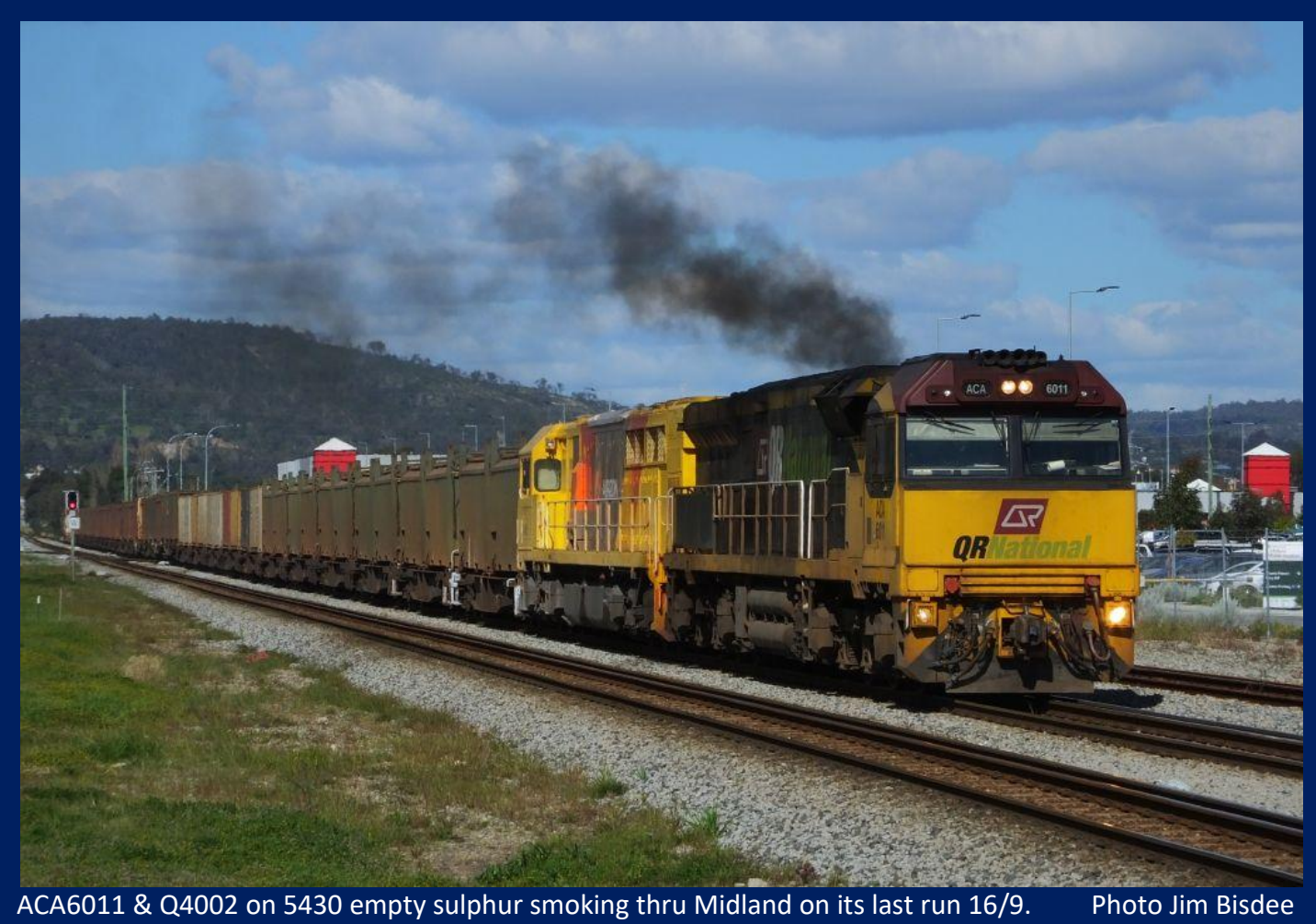
ACADOTT & Q4002 On 5450 empty sulphur smoking thru ividiand on its last run 10/9. Prioto inin bisdee