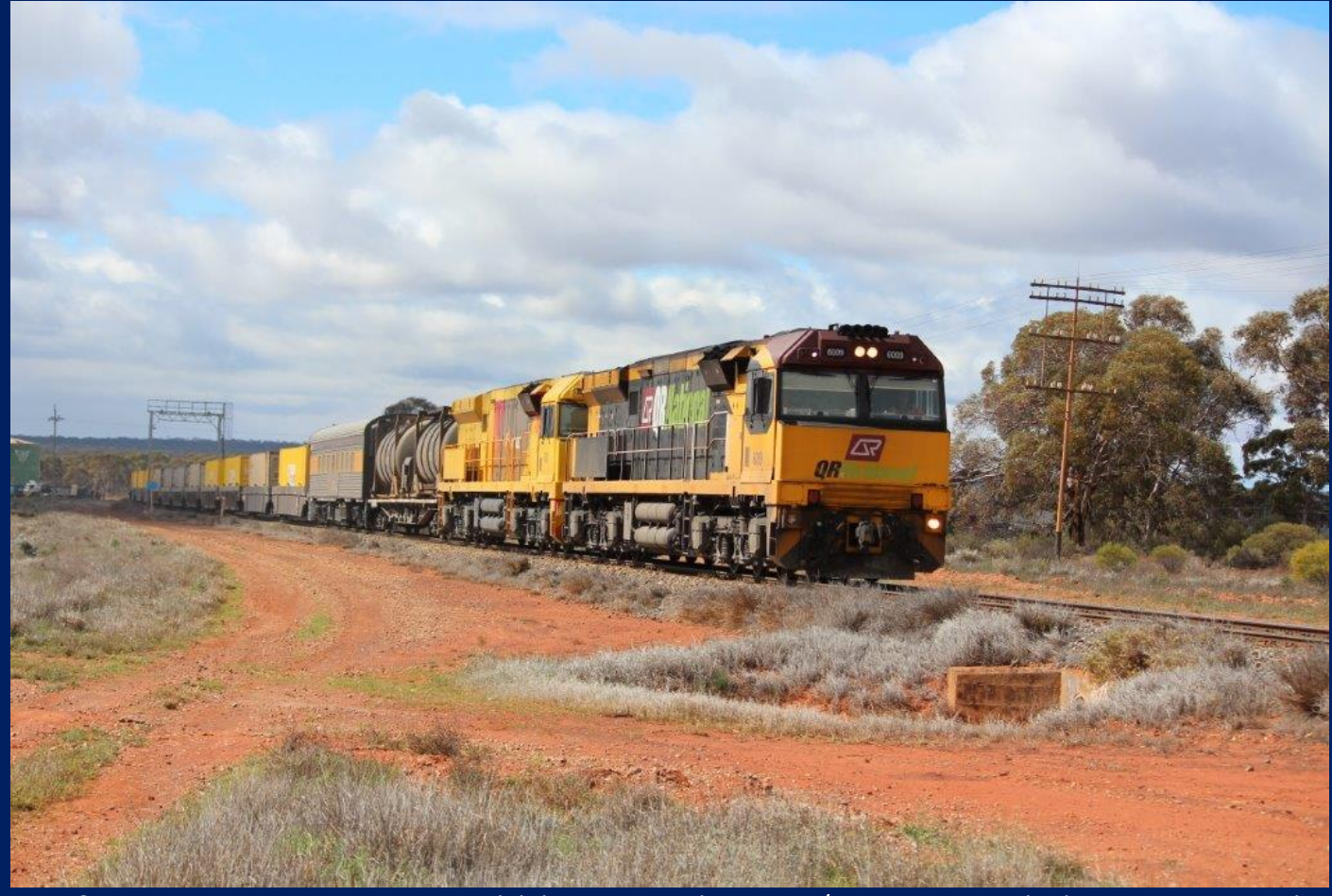
6009 & 6001 on 7MP1 Aurizon intermodal departing Parkeston 28/8.