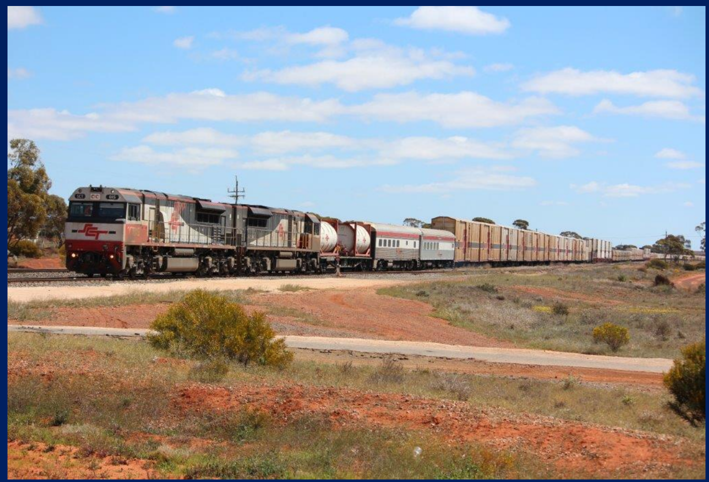
SCT015 & SCT005 on 6PM9 SCT freight two crew cars entering Parkeston yard 17/9.