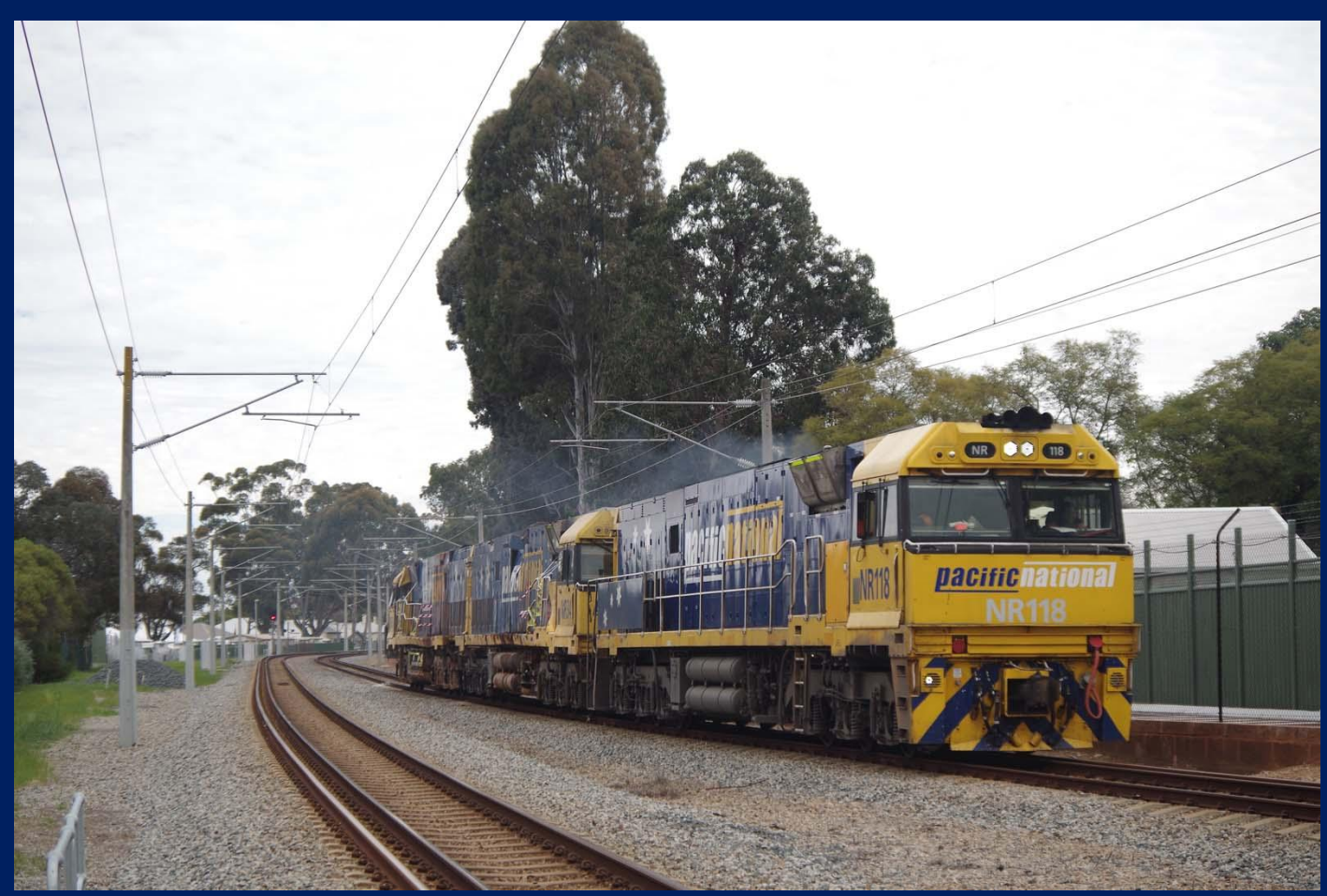
NR118, damaged NR34 & NR50 on 6P24 light engine under the wires at East Guildford August 26th.