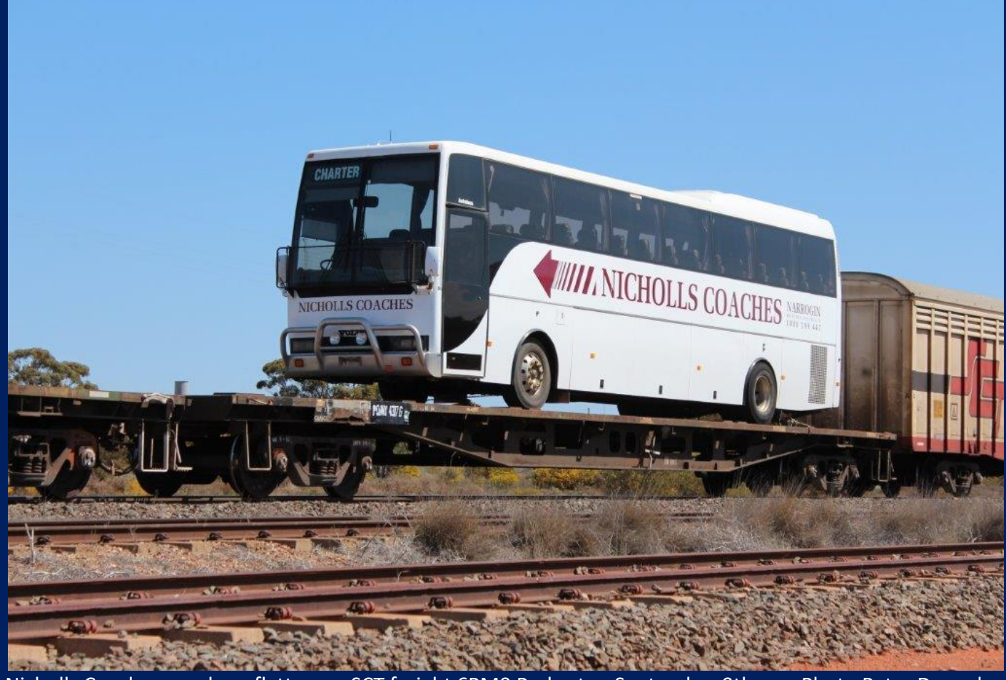
Nicholls Coaches coach on flattop on SCT freight 6PM9 Parkeston September 9th.