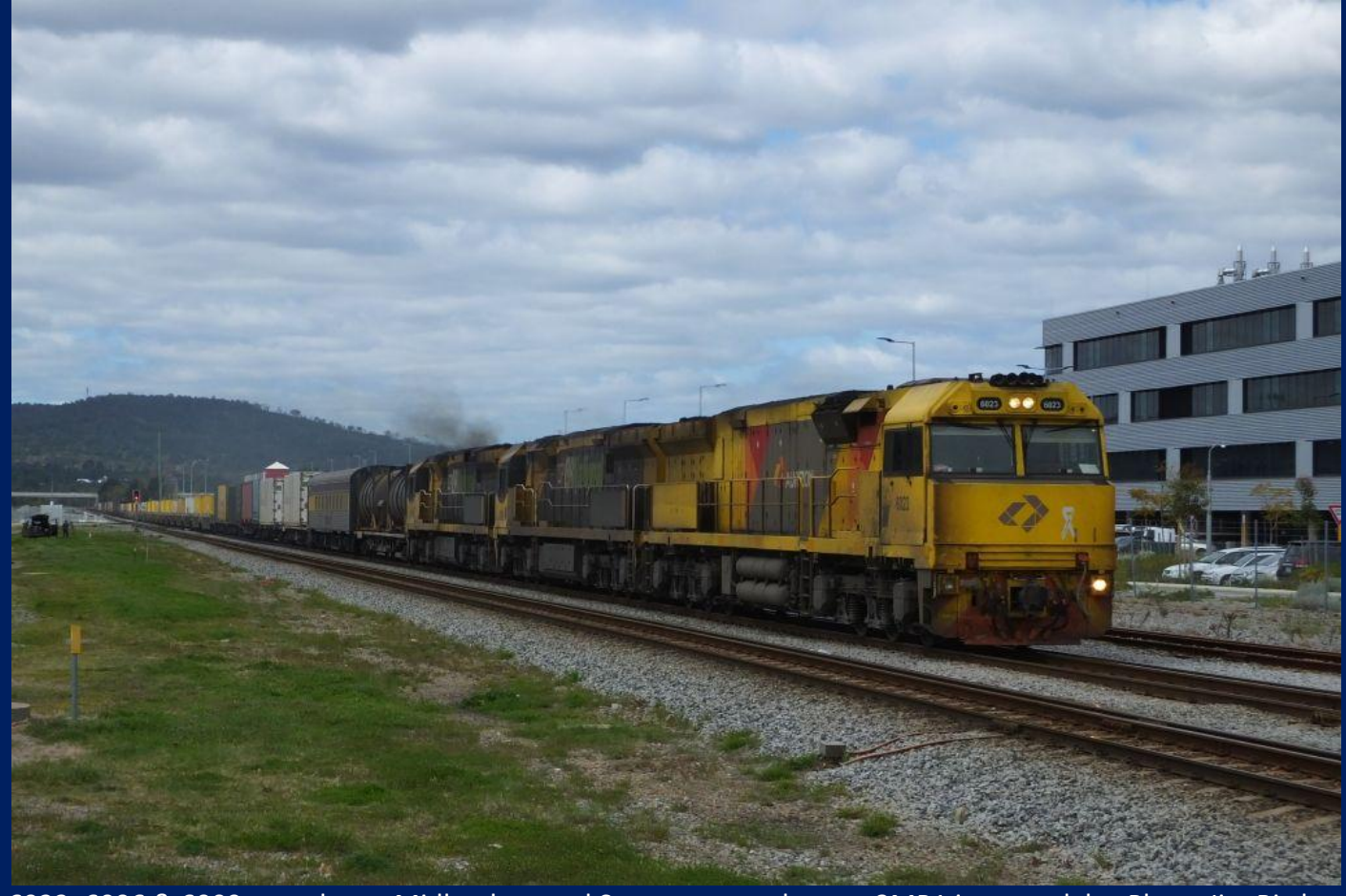
6023, 6006 & 6009 next day at Midland second Sept on a very late on 3MP1 intermodal.