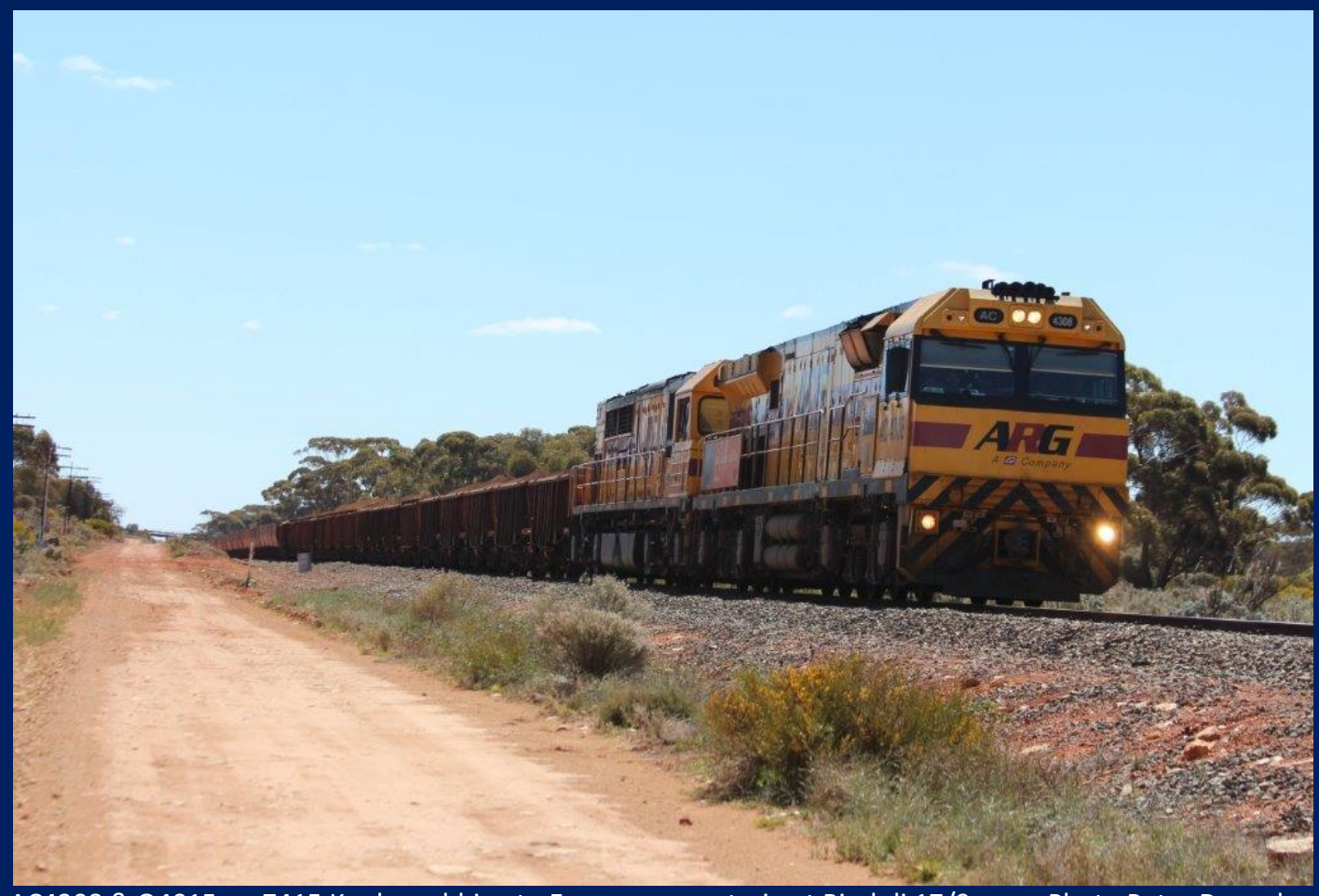
AC4308 & Q4015 on 7415 Koolyanobbing to Esperance ore train at Binduli 17/9.