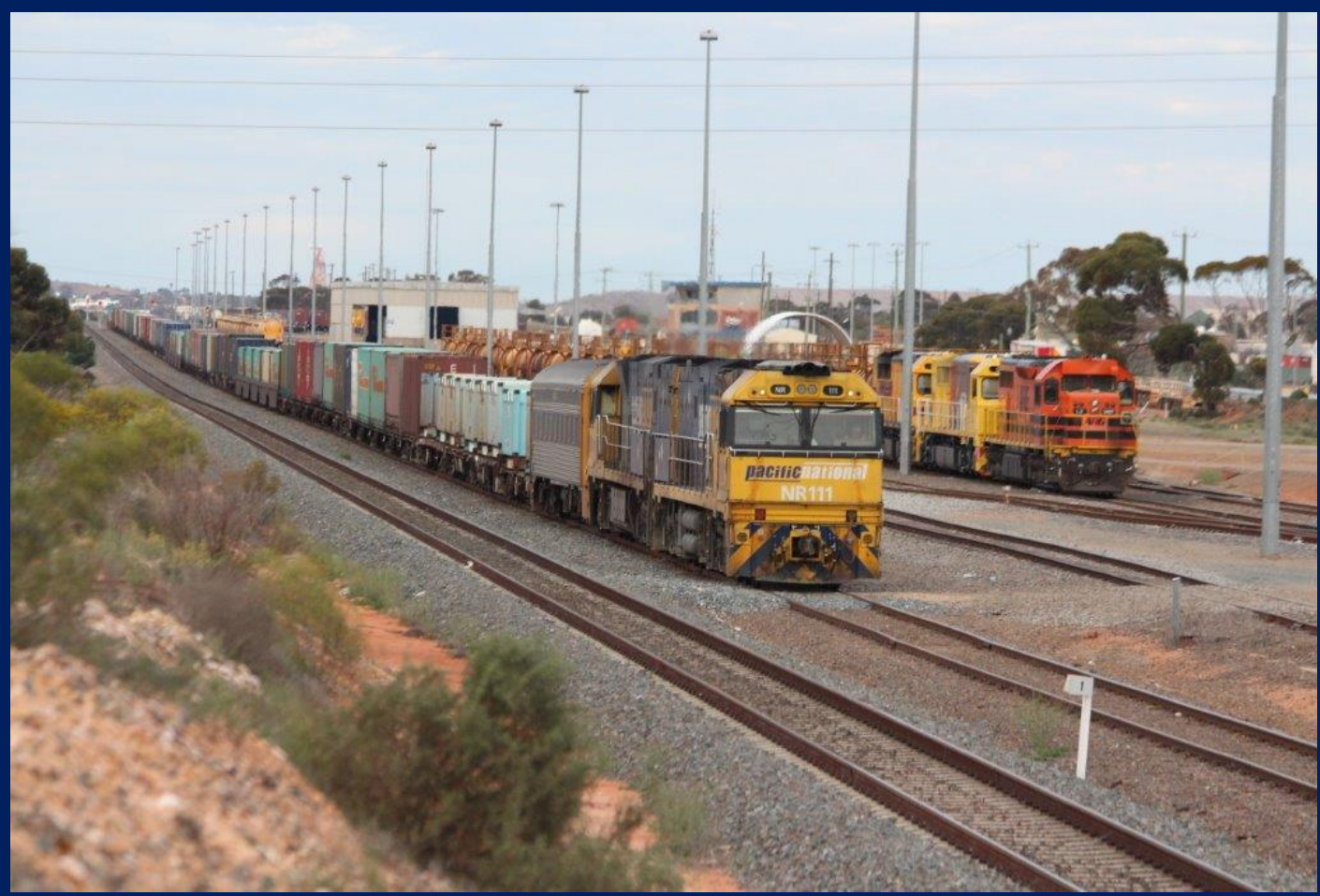
NR111 & NR8 stabled WEK with LZ3107, Q4011 & Q4013 on acid tankers 2426 12/9.