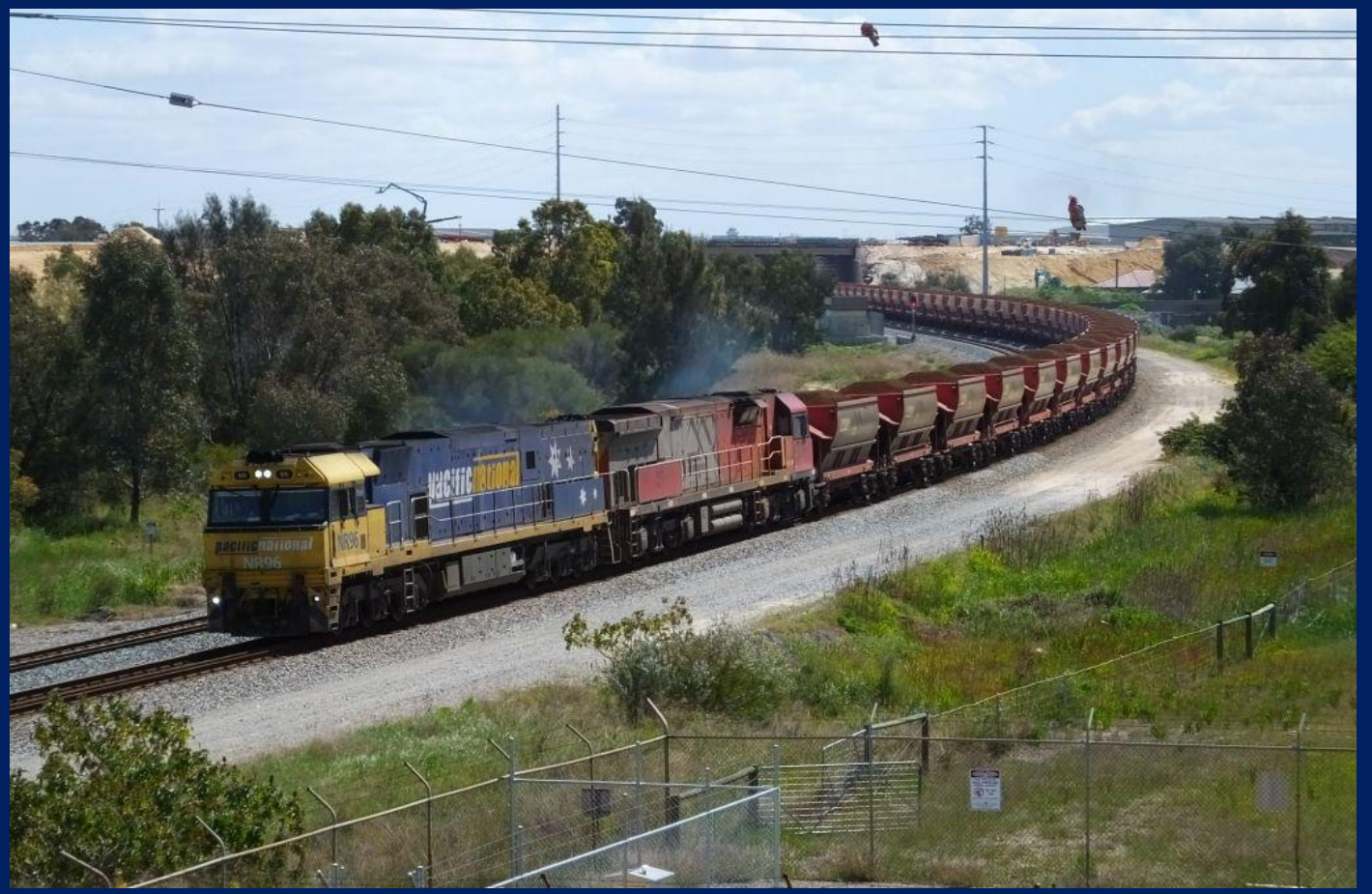
NR96 & MRL004 on 3030 Polaris ore at Wattle Grove September 28th.