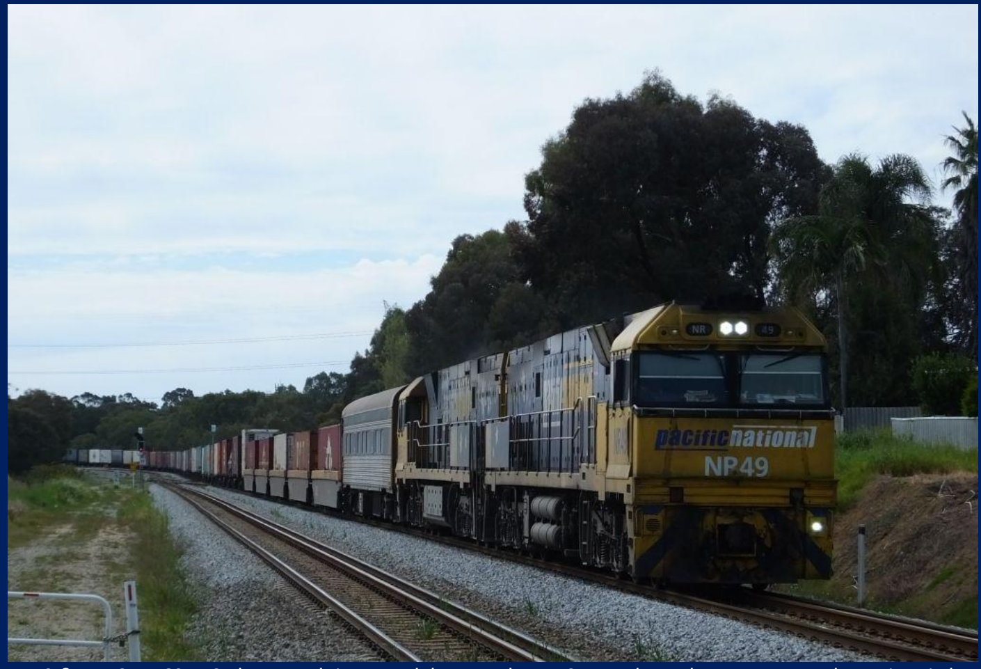
NR49 & NR52 on 6SP5 Sydney Perth intermodal at Hazelmere September 4th.