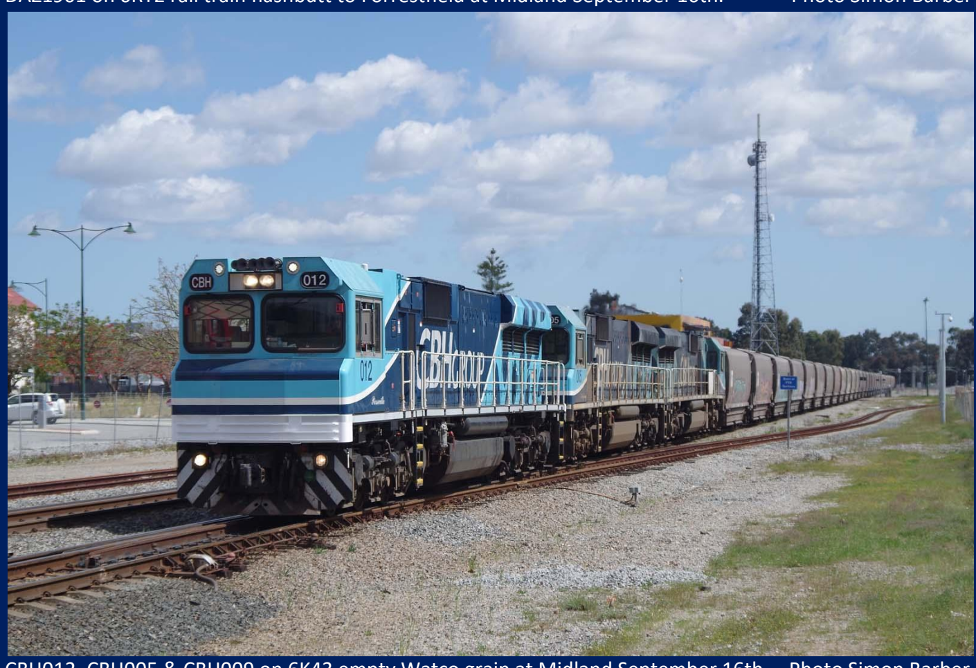
CBH012, CBH005 & CBH009 on 6K43 empty Watco grain at Midland September 16th.