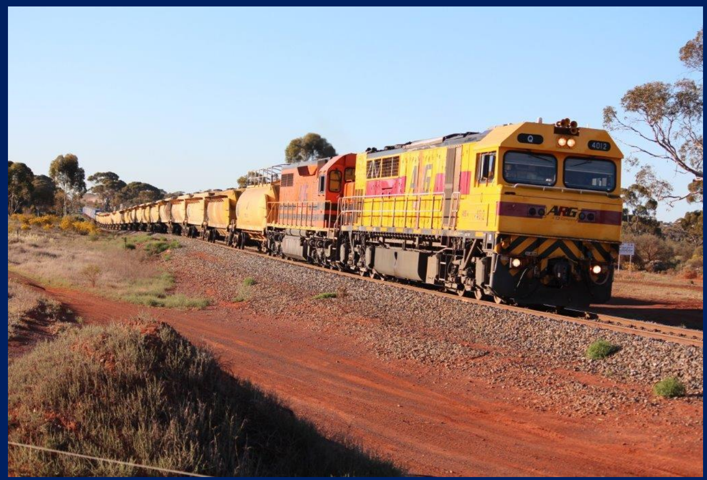
Q4012 & LZ3117 on 7478 combined nickel and containers nearing Kalgoorlie 17/9.