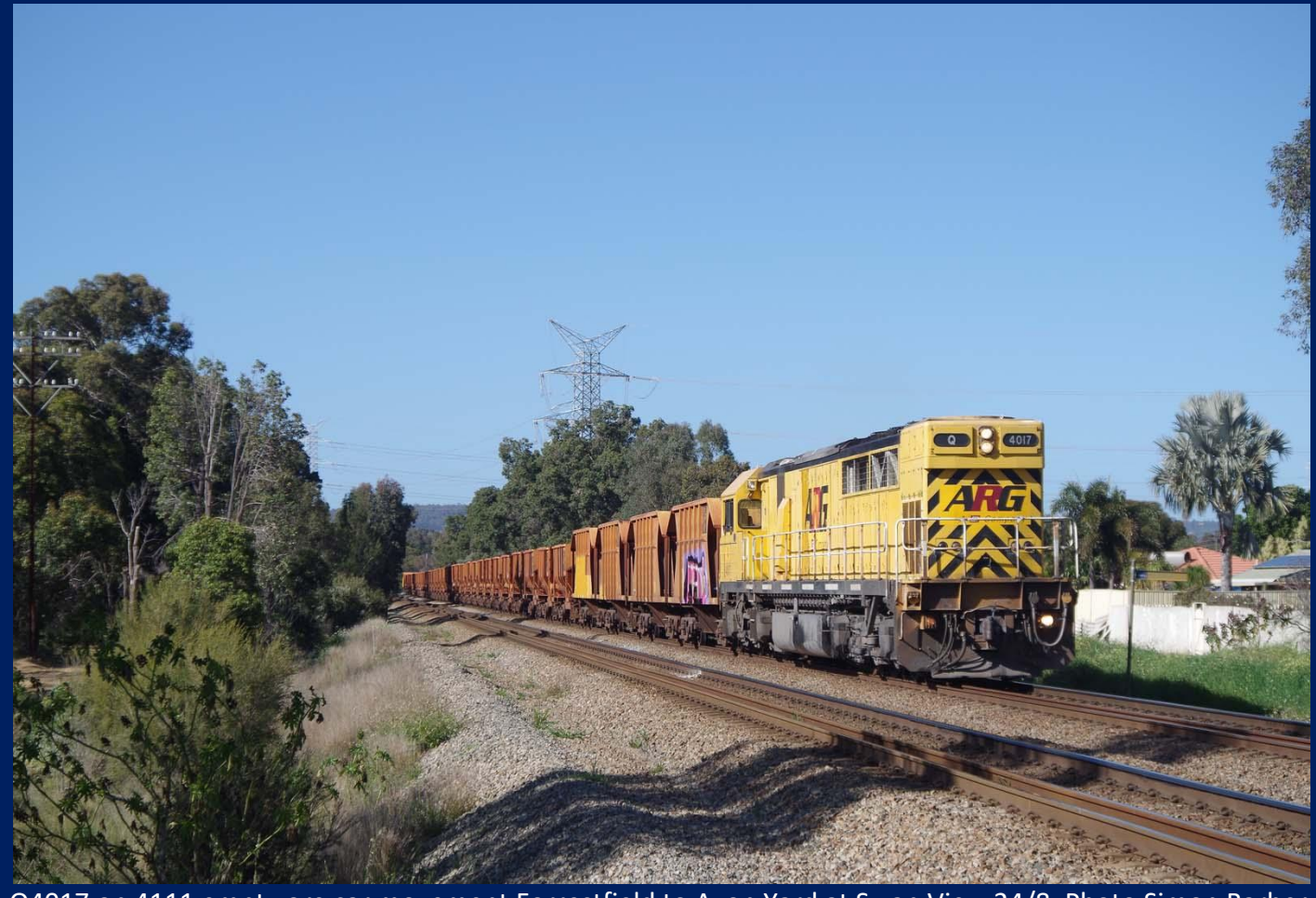
Q4017 on 4111 empty ore car movement Forrestfield to Avon Yard at Swan View 24/8.