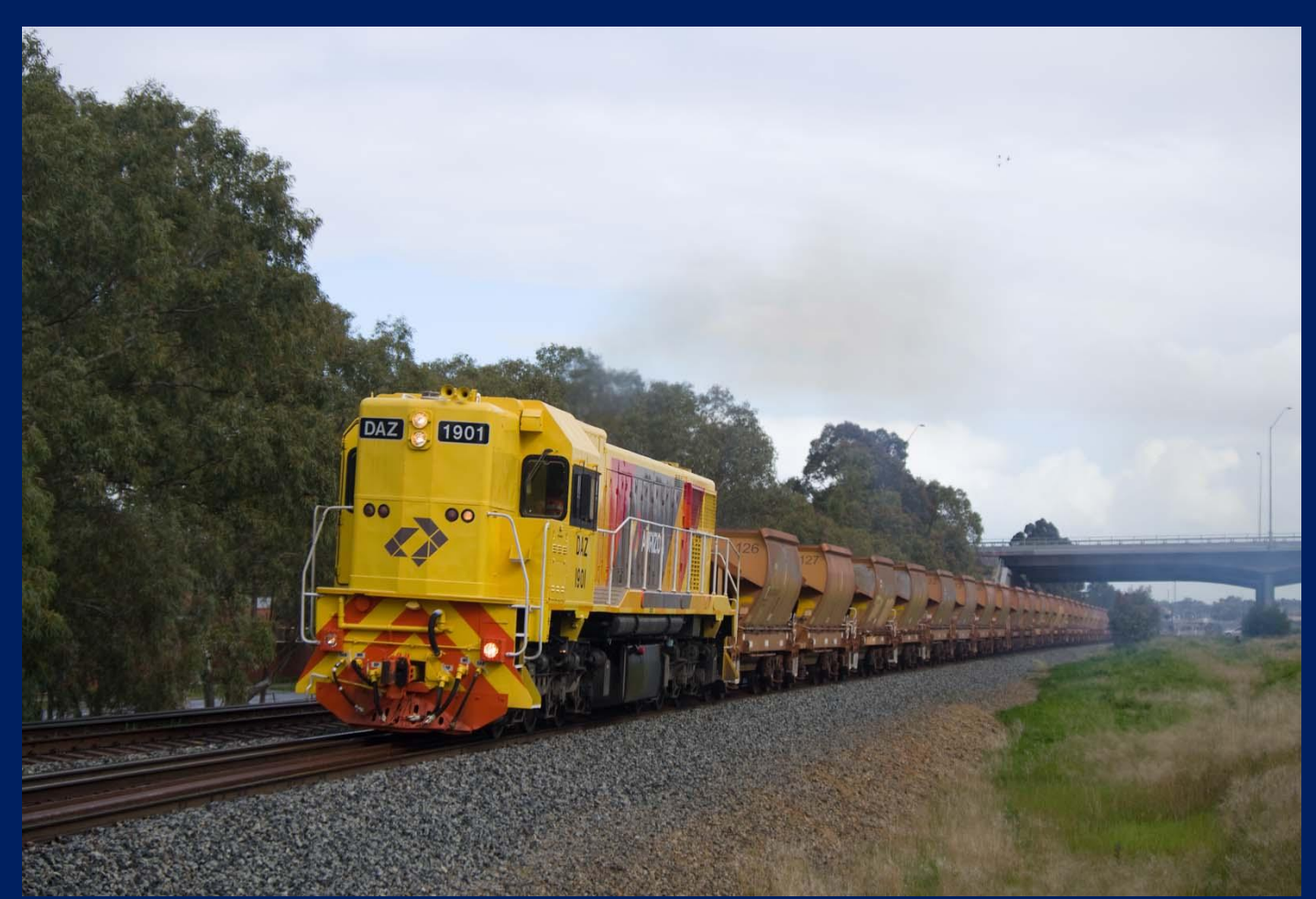
DAZ1901 on 4751 empty ore wagon transfer to Avon Yard for storage at Bellevue 7/9.