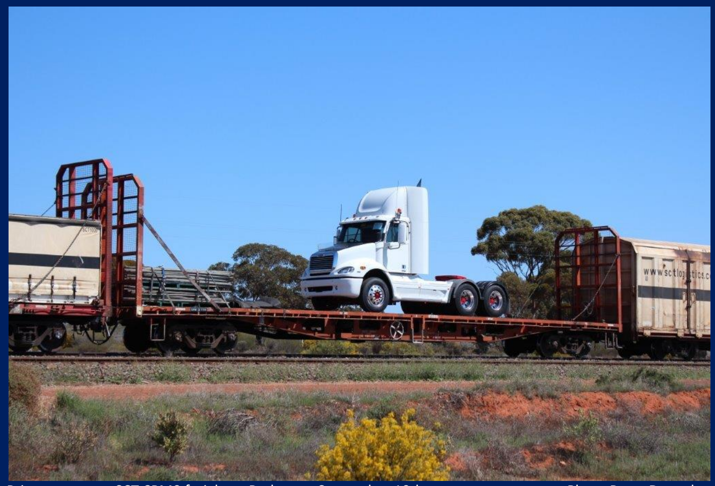
Prime mover on SCT 6PM9 freight at Parkeston September 10th.