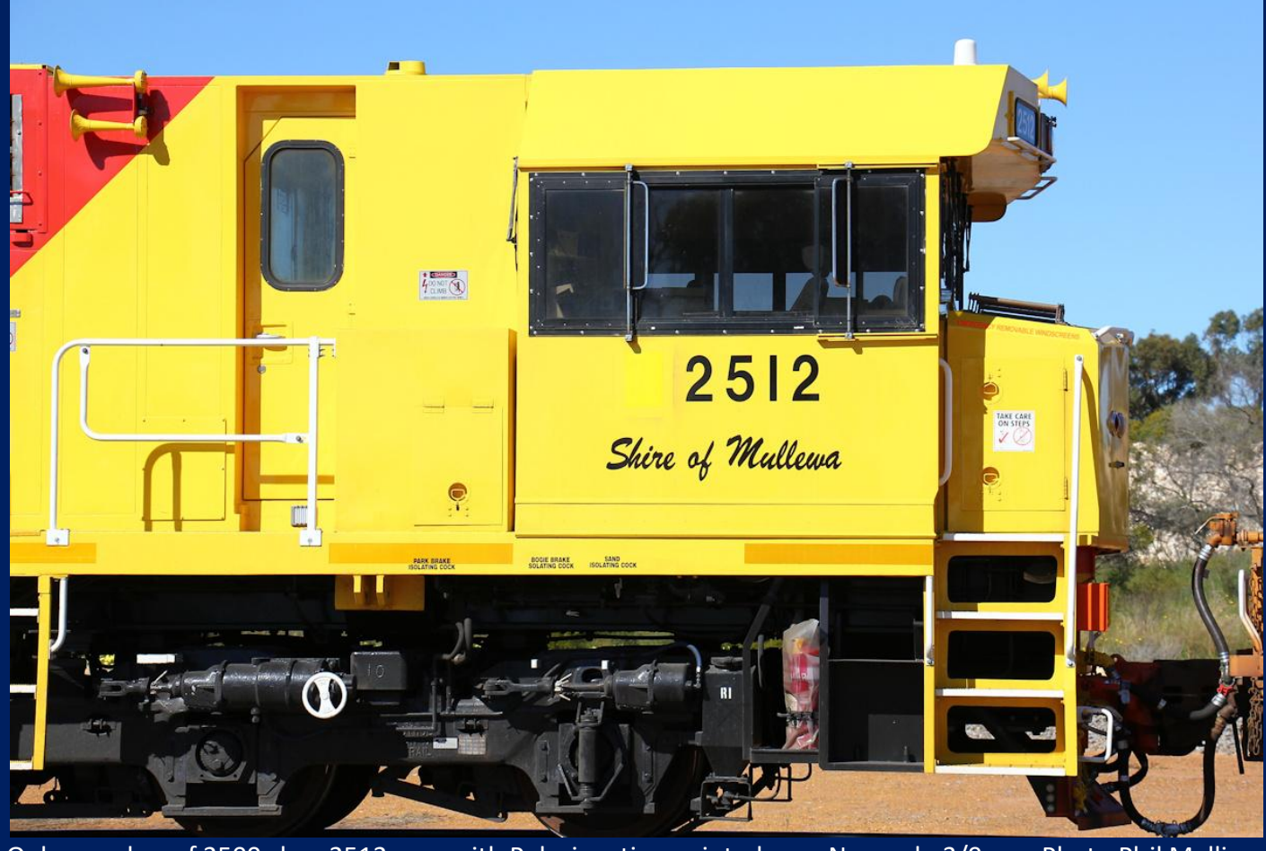
Only member of 2500 class 2512 now with P designation painted over Narngulu 3/9.