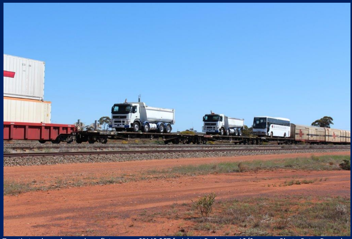
Two tip trucks and a coach on flat cars on 6PM9 SCT freight at Parkeston 10/9.