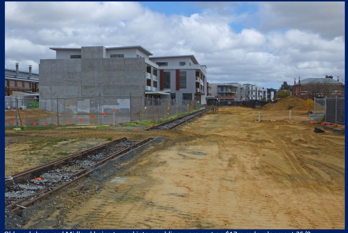
Old workshop yard Midland being turned into a public square part on $17m redevelopment 25/9.