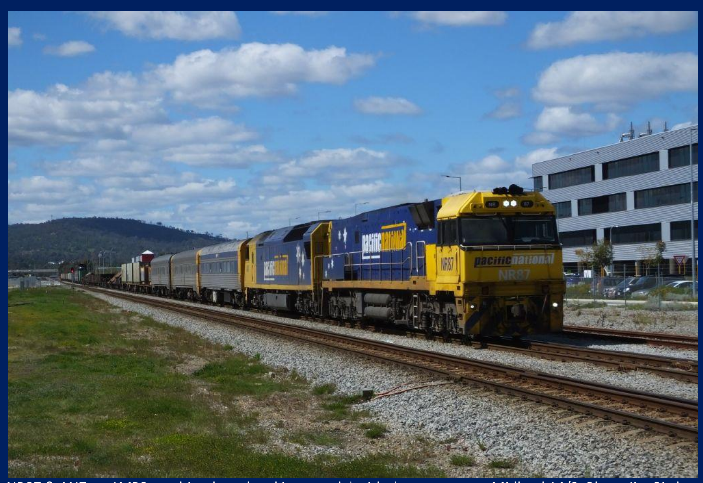
NR87 & AN7 on 1MP2 combined steel and intermodal with three crew cars Midland 14/9.