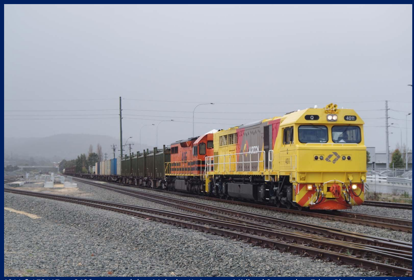
4011 & LZ3117 on 3430 empty sulphur Malcolm-Kwinana at Midland September 7th.