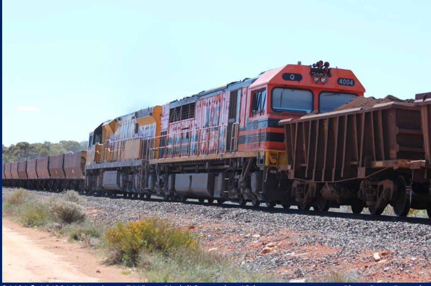
Q4404 & AC4304 DPU units on 7415 ore Binduli September 19th.