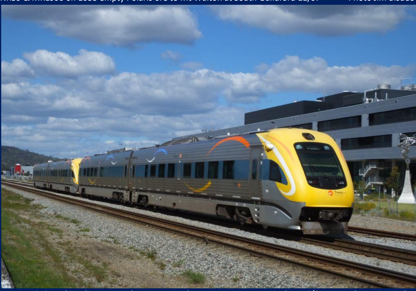
Four car 6484 Kalgoorlie East Perth Prospector about to crossover to PTA line 16/9.