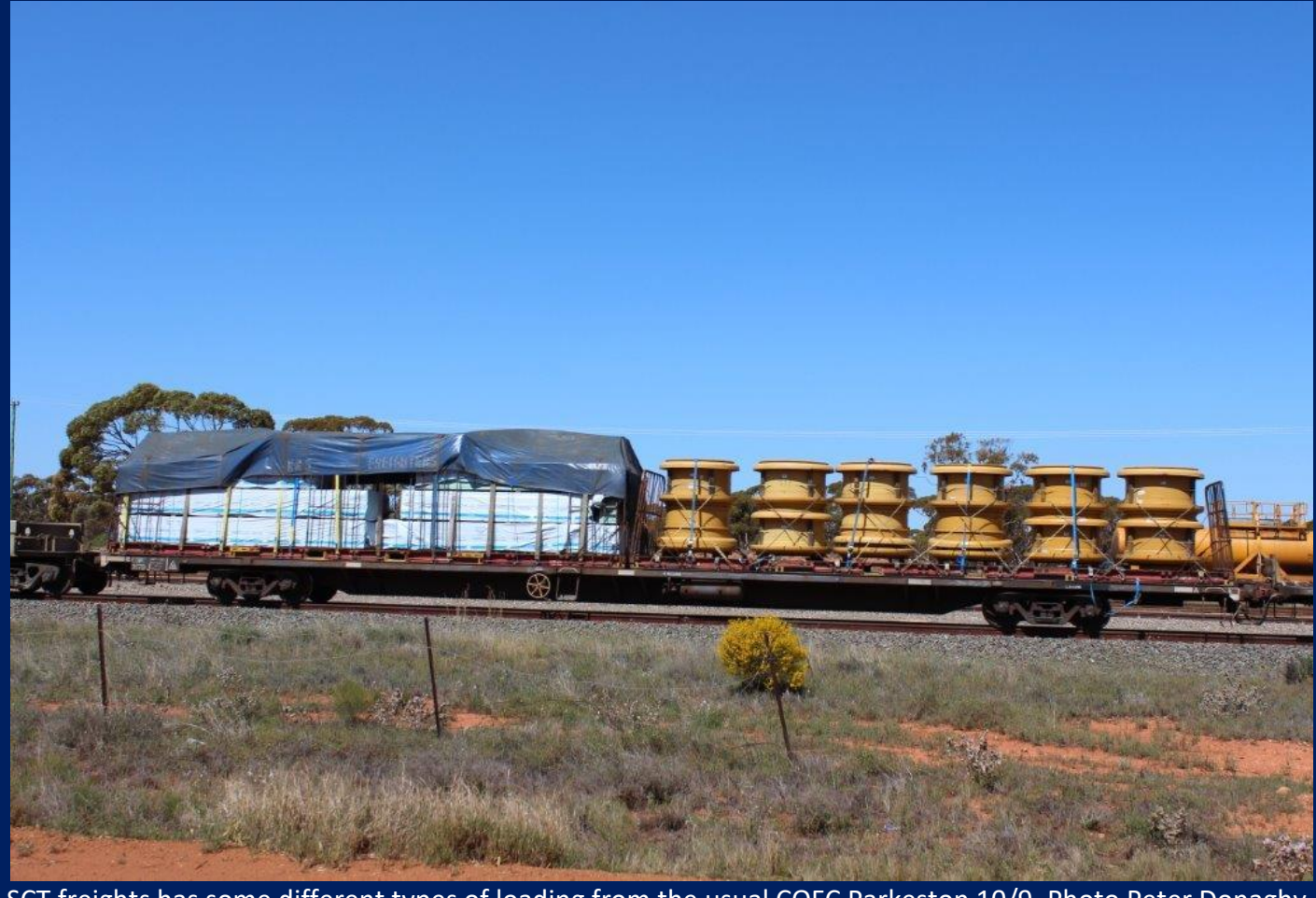
SCT freights has some different types of loading from the usual COFC Parkeston 10/9.