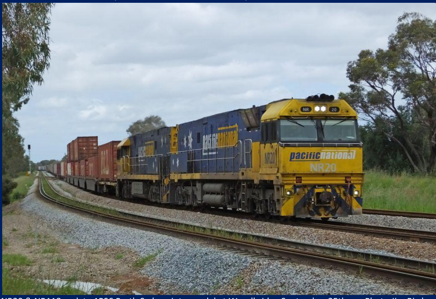
NR20 & NR118 on late 1PS6 Perth Sydney intermodal at Woodbridge September 25th.