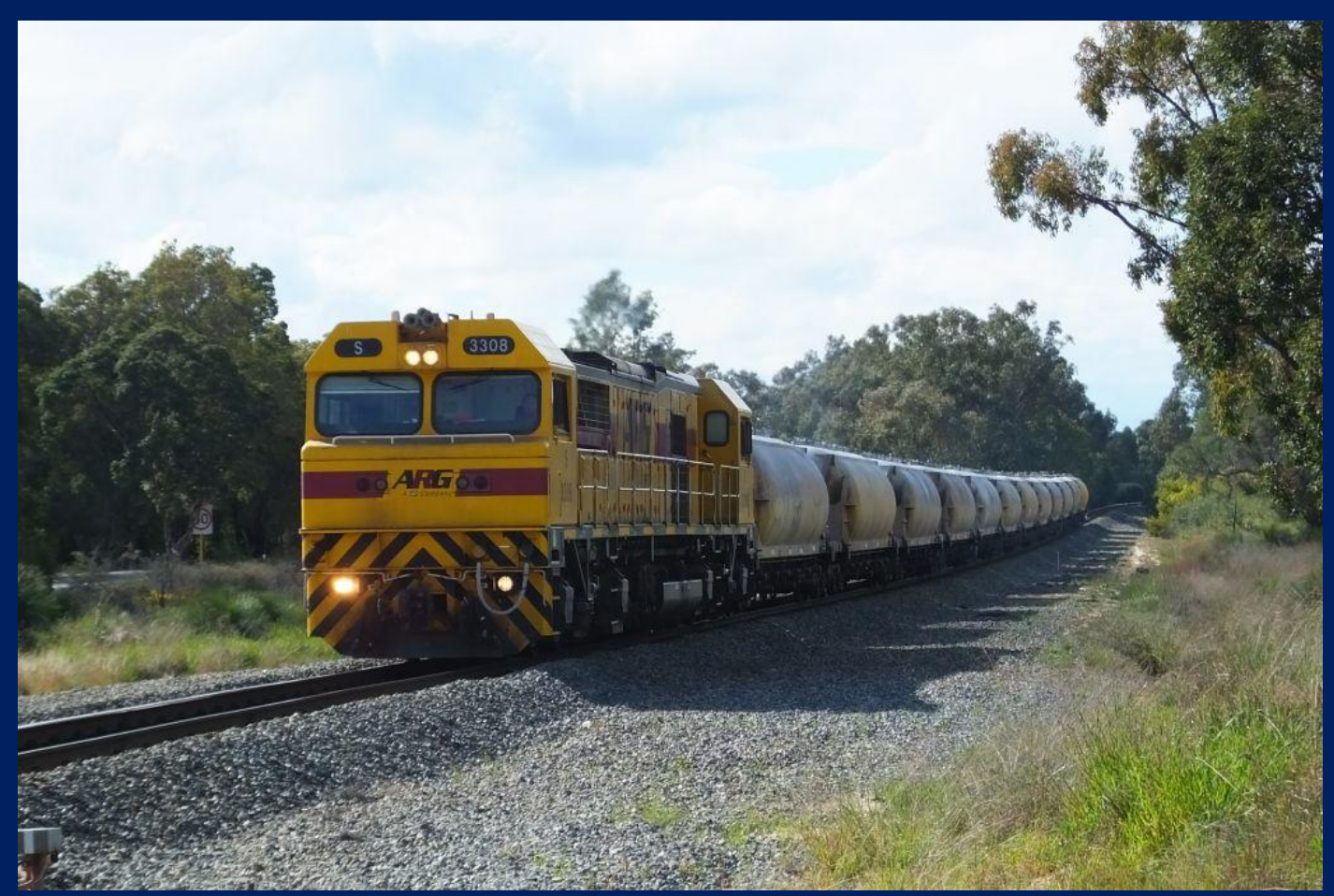
S3308 on 3271 lime train to Hamilton climbing grade towards Mundijong September 6th.