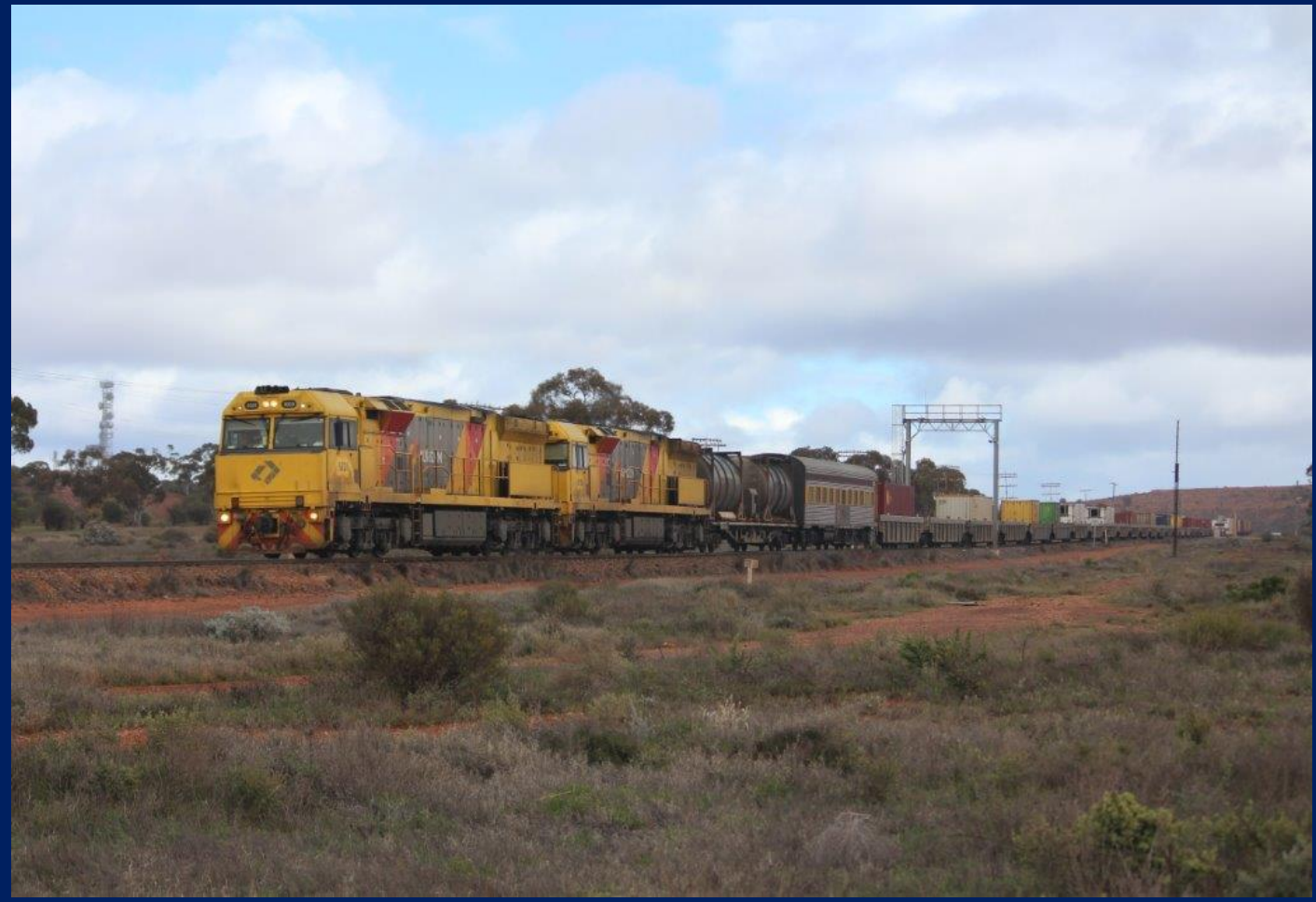
6028 & 6026 on 1PM1 Aurizon intermodal passing under out of gauge detector Parkeston August 28th.