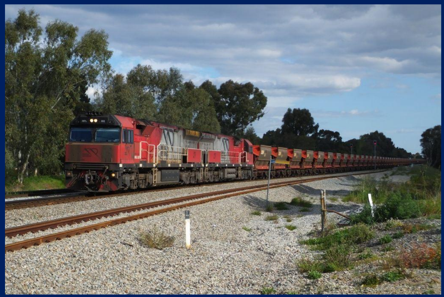
MRL002 & MRL004 on 7025 empty Polaris ore to Mt Walton at Woodbridge 17/9.