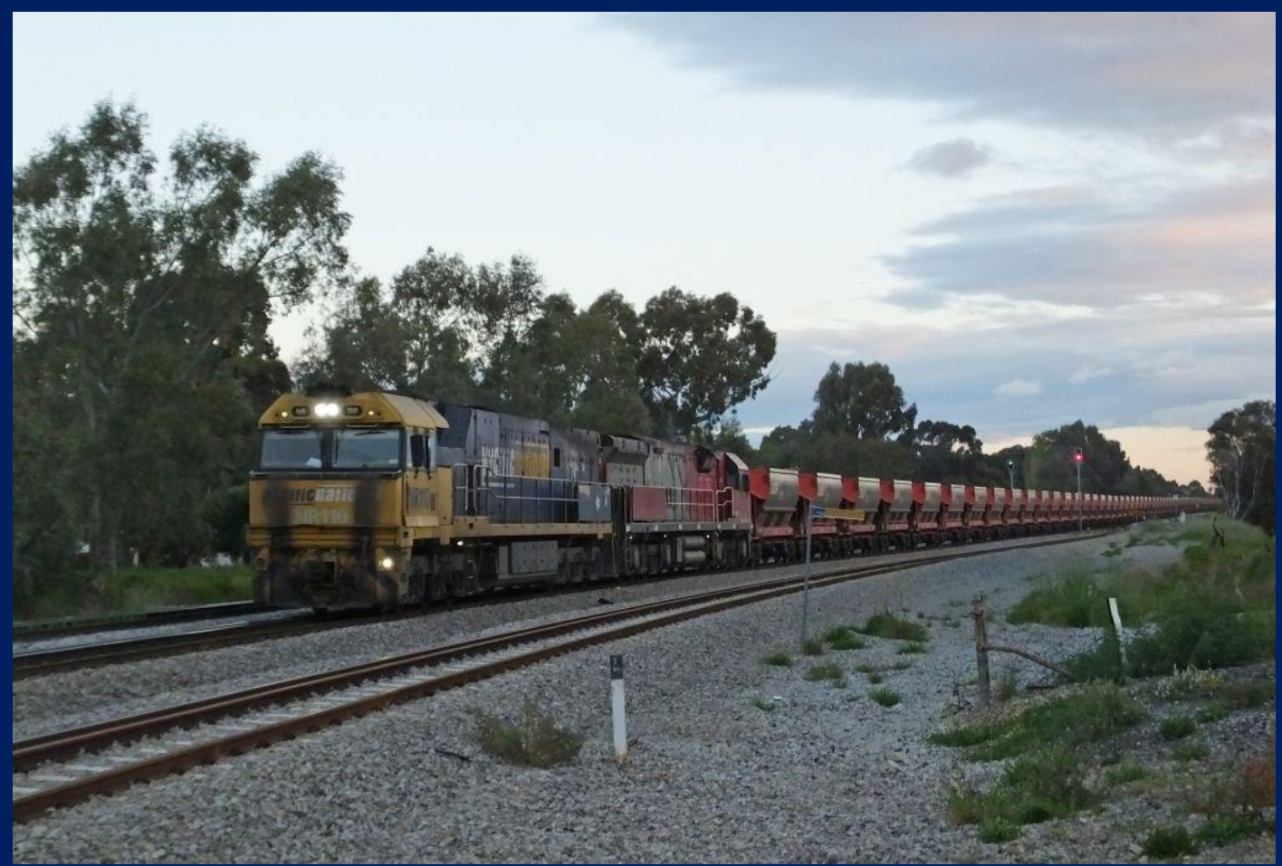
NR110 & MRL001 on 1035 empty Polaris ore at Woodbridge sunset September 11th.