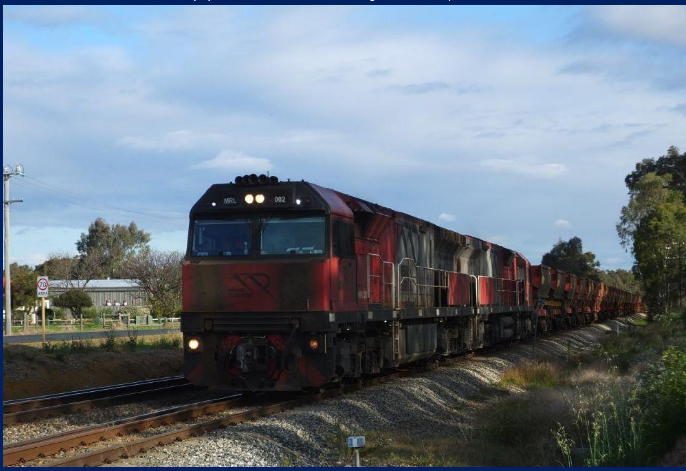
MRL002 & MRL004 on 7035 empty Polaris ore Herne Hill September 10th.