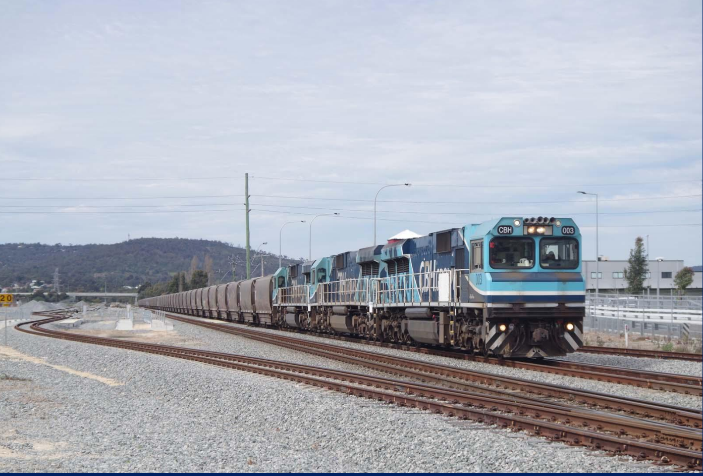
CBH003, CBH025 & CBH002 on 6K44 Watco grain Midland August 26th.