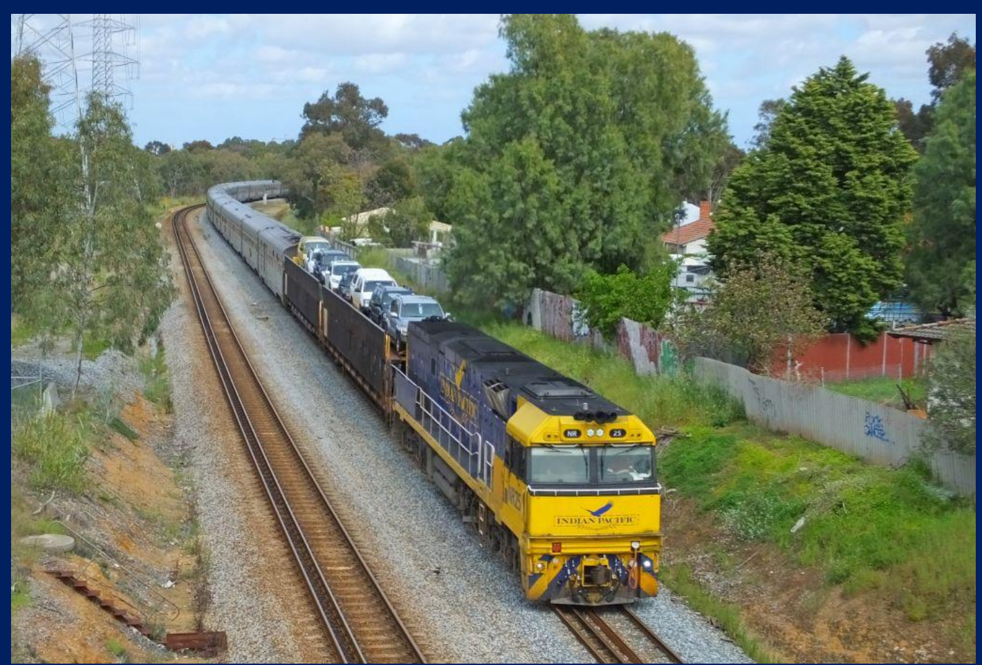
NR25 on 1PA8 Indian Pacific interstate passenger at Bellevue September 25th.