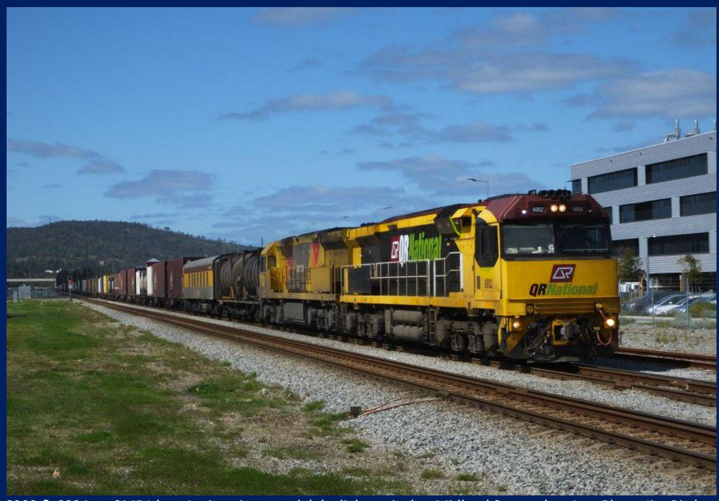
6002 & 6024 on 2MP1 late Aurizon intermodal daylight arrival at Midland September 1st.