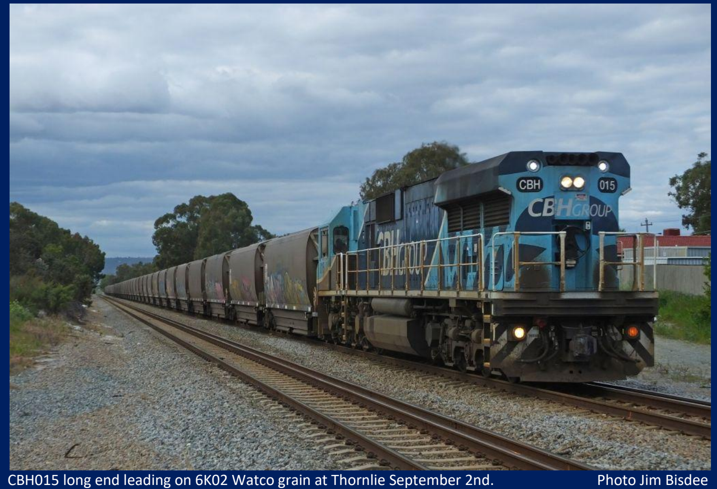
CBH015 long end leading on 6K02 Watco grain at Thornlie September 2nd.