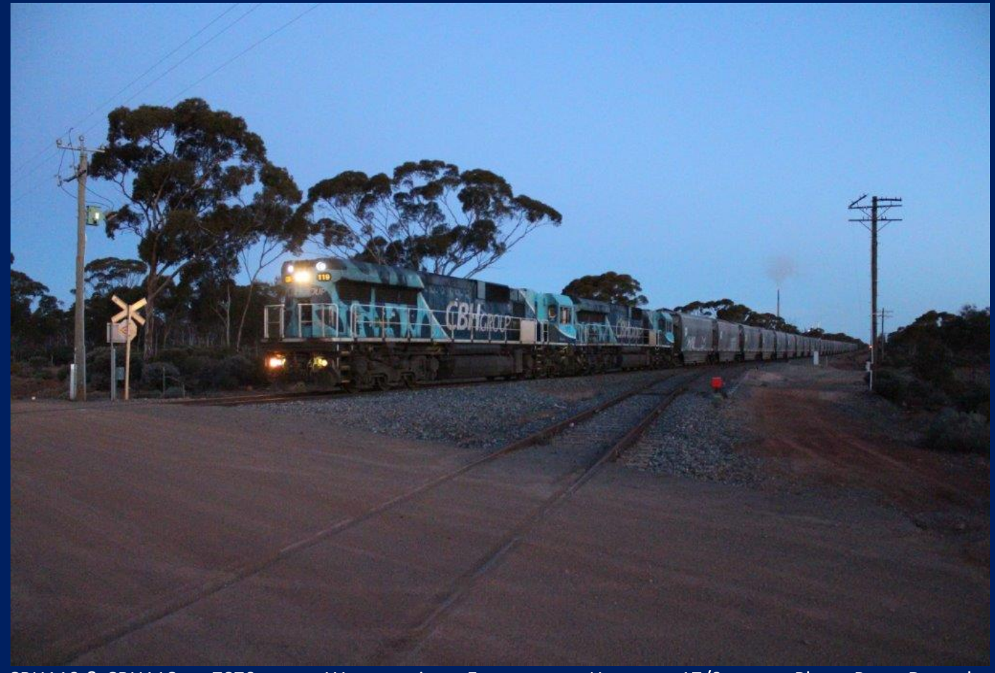
CBH119 & CBH118 on 7S70 empty Watco grain ex Esperance at Hampton 17/9.