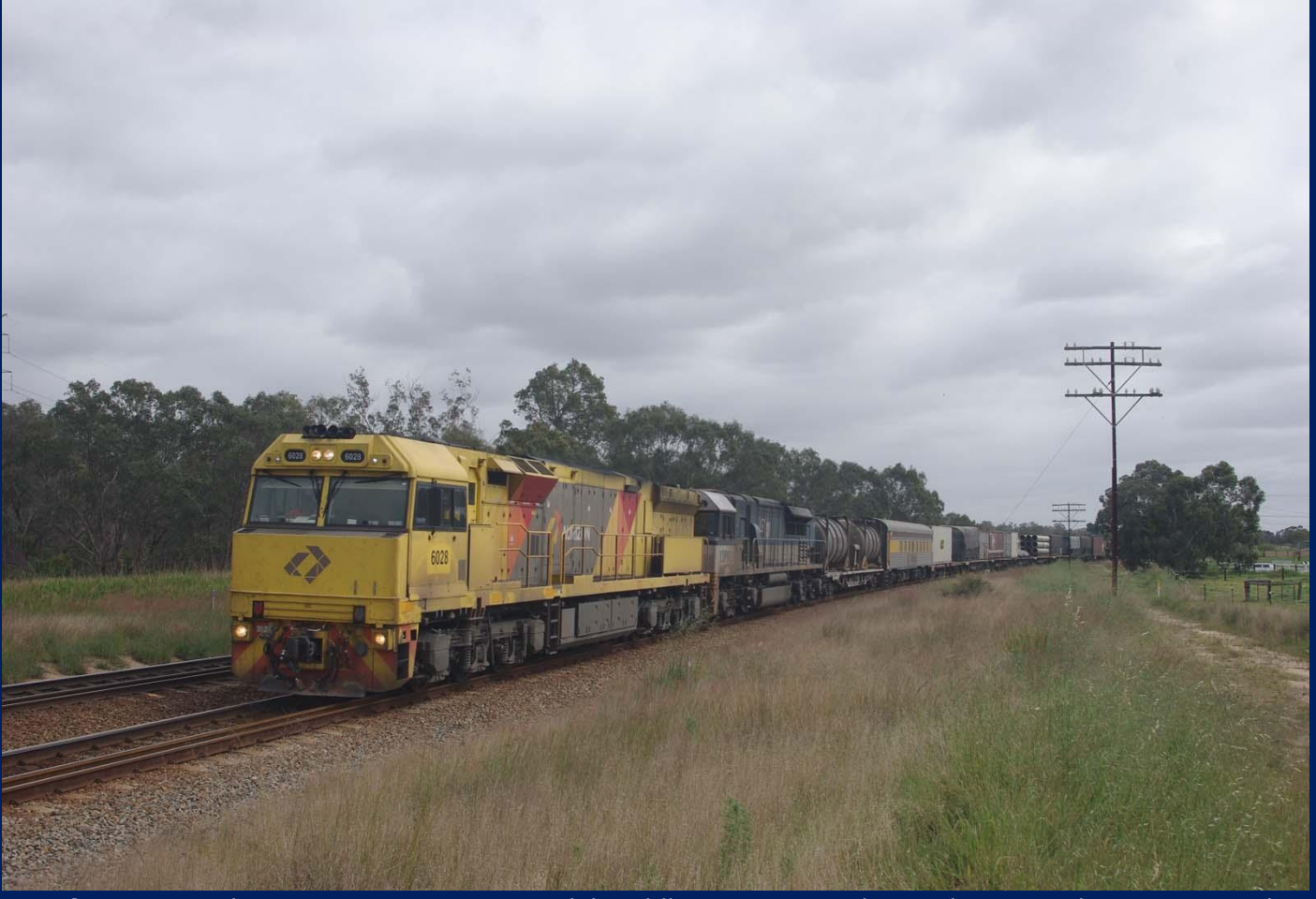
6028 & LDP003 on late 6MP1 Aurizon intermodal Middle Swan September 19th.