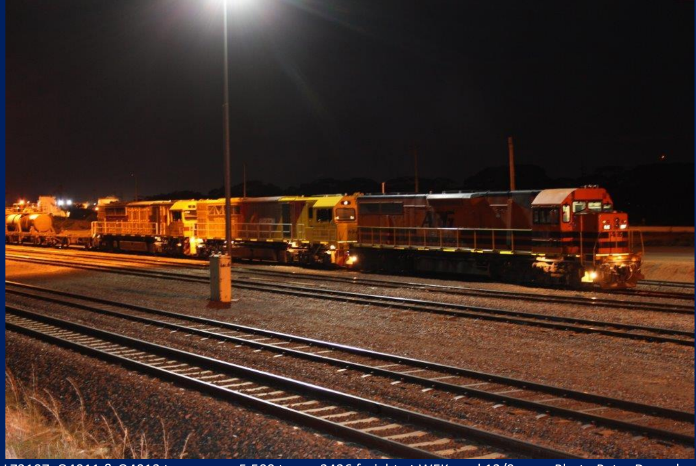
LZ3107, Q4011 & Q4013 to run over 5,500 tonne 2426 freight at WEK yard 12/9.