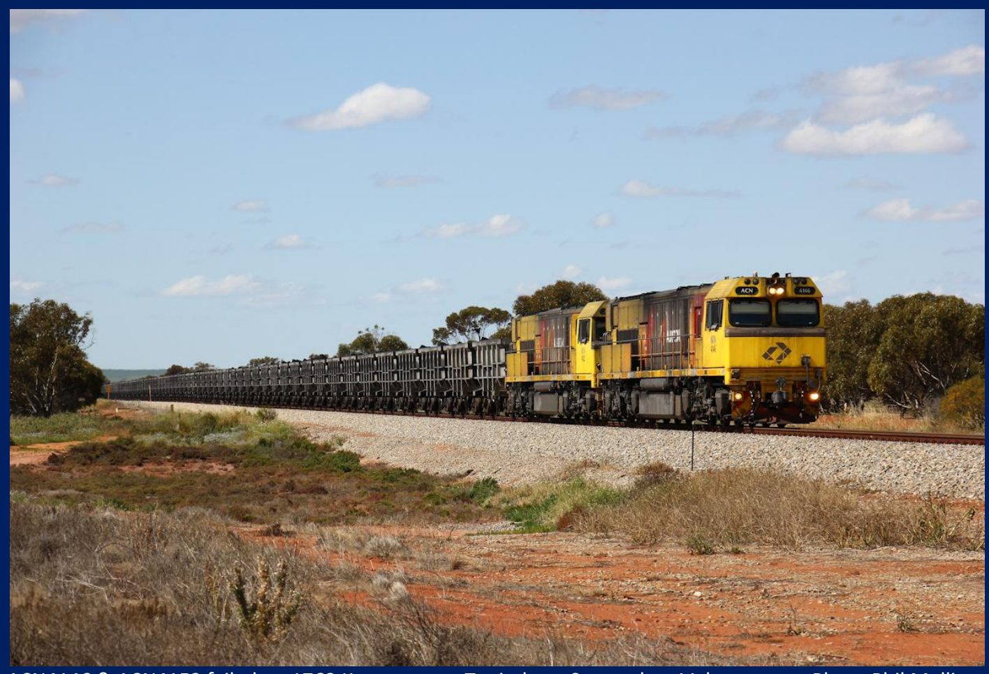
ACN4146 & ACN4152 failed on 1763 Karara ore at Tenindewa September 11th.