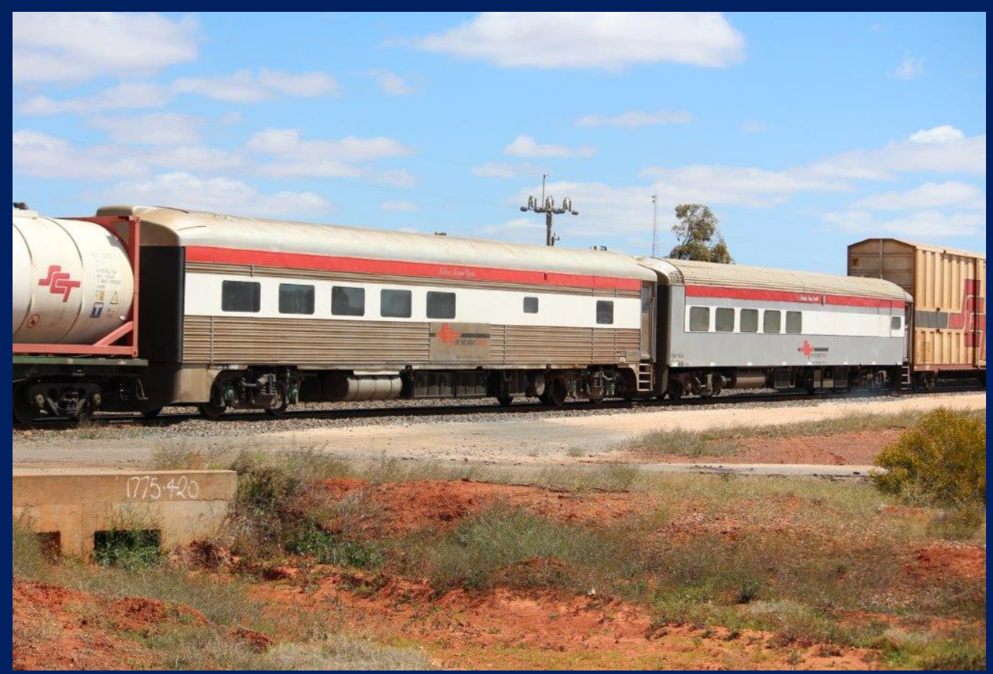
Comparison of SCT ex Bluebird PDAY crew cars 001 and 003 at Parkeston 17/9.