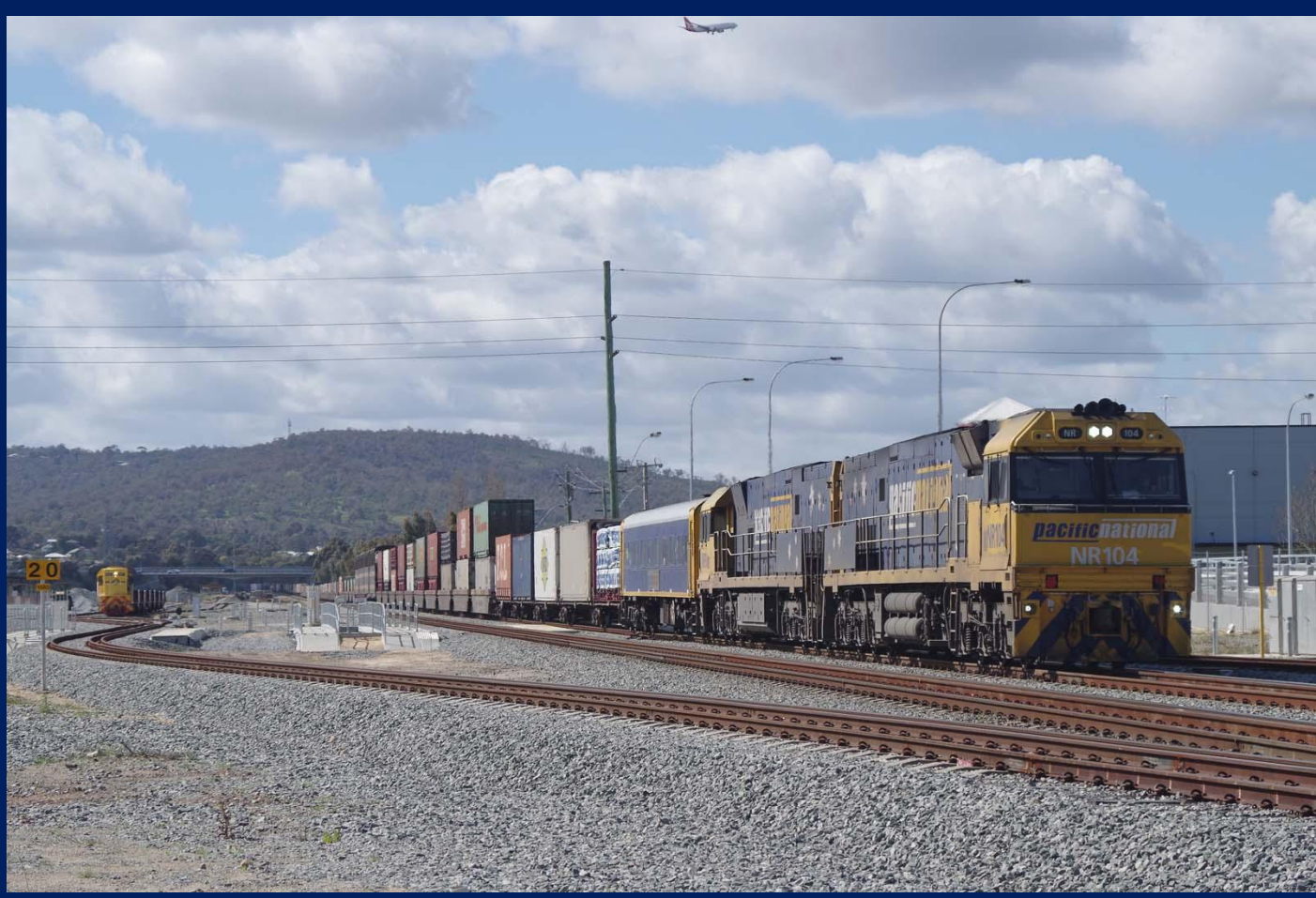
NR104 & NR90 on 3MP5 intermodal passing DAZ1901 in Midland yard September 16th.