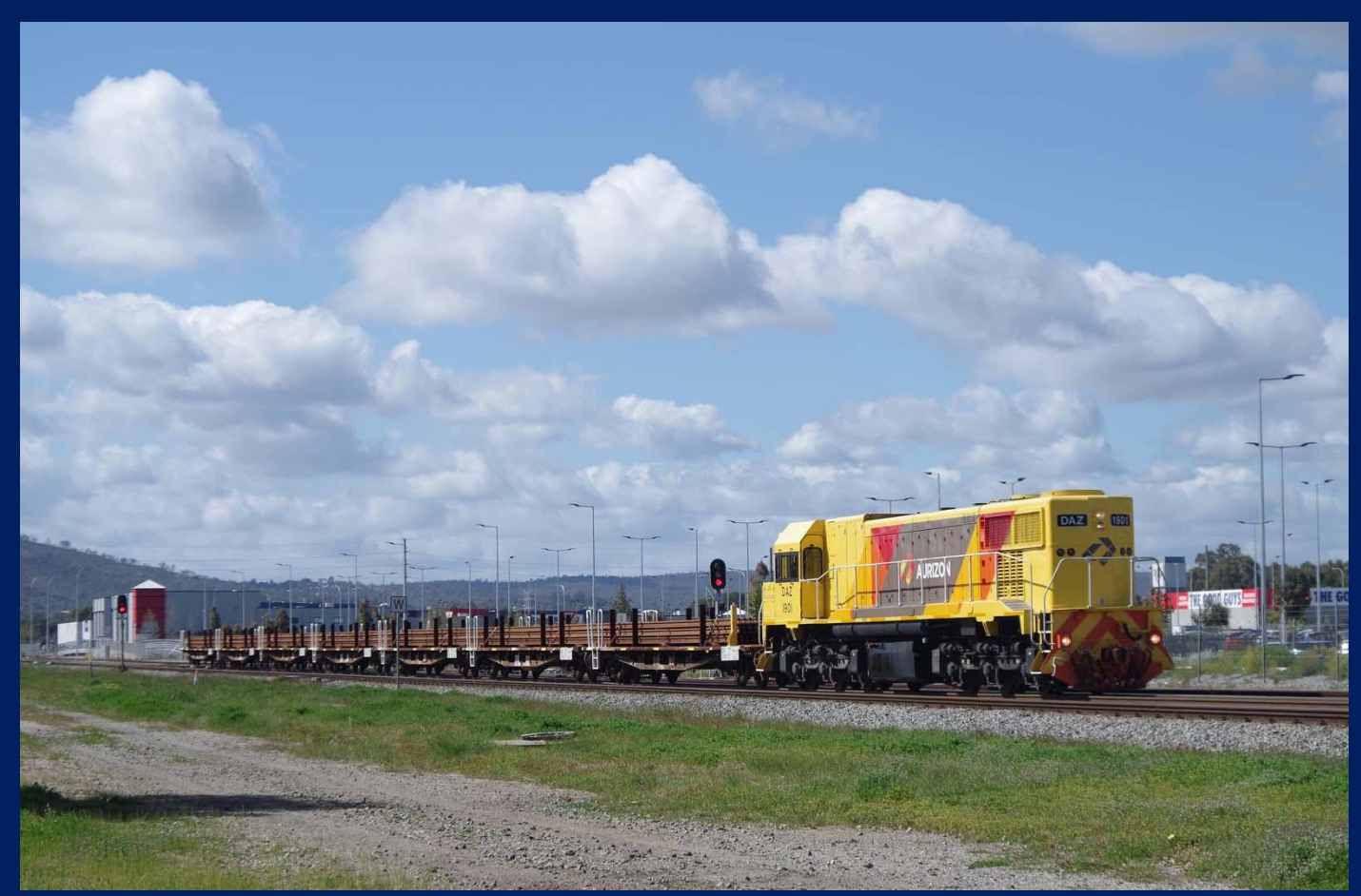
DAZ1901 on 6RT2 rail train flashbutt to Forrestfield at Midland September 16th. Ph