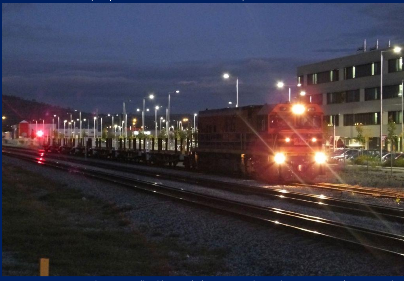
P2513 on 7RT2 empty rail train in Midland loop in darkness September 10th.