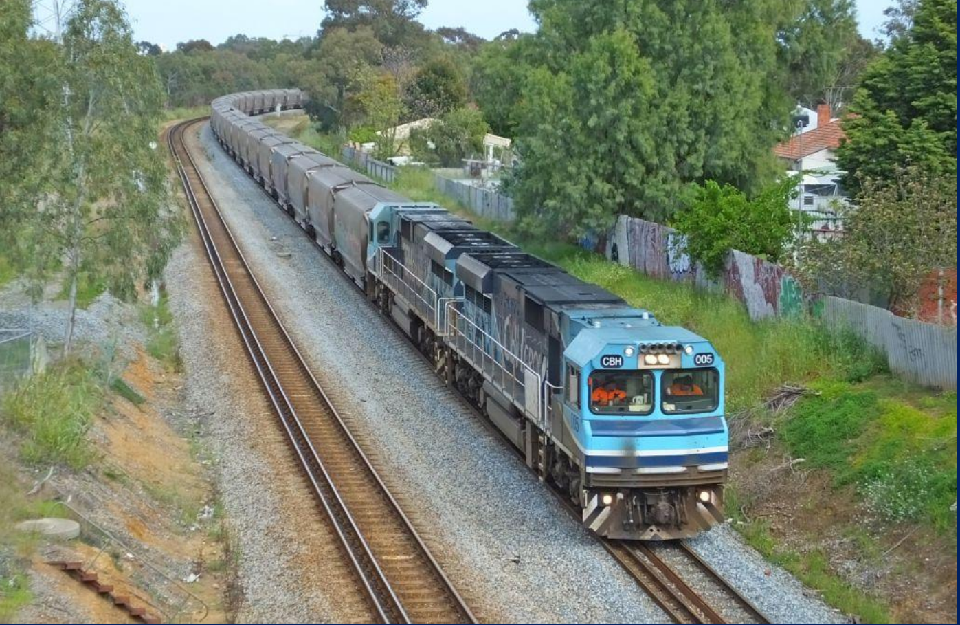
CBH005 & CBH009 on 1K13 empty Watco grain to Miling line at Bellevue 25/9.