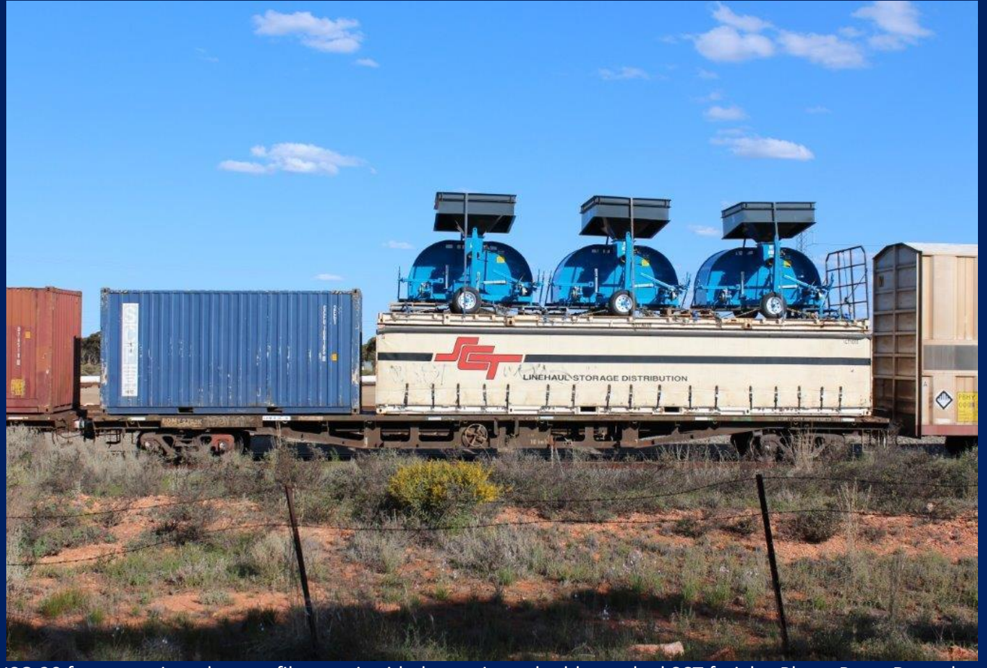
ISO 20 foot container, low profile curtain sided container, double stacked SCT freight.