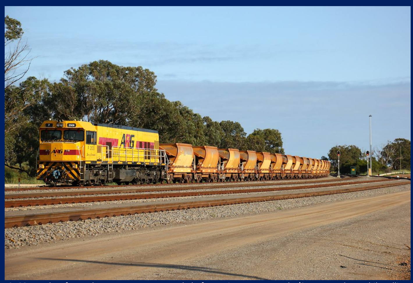
P2508 on rake of stored MHAF ore cars Narngulu before going to Avon Yard 1/9.