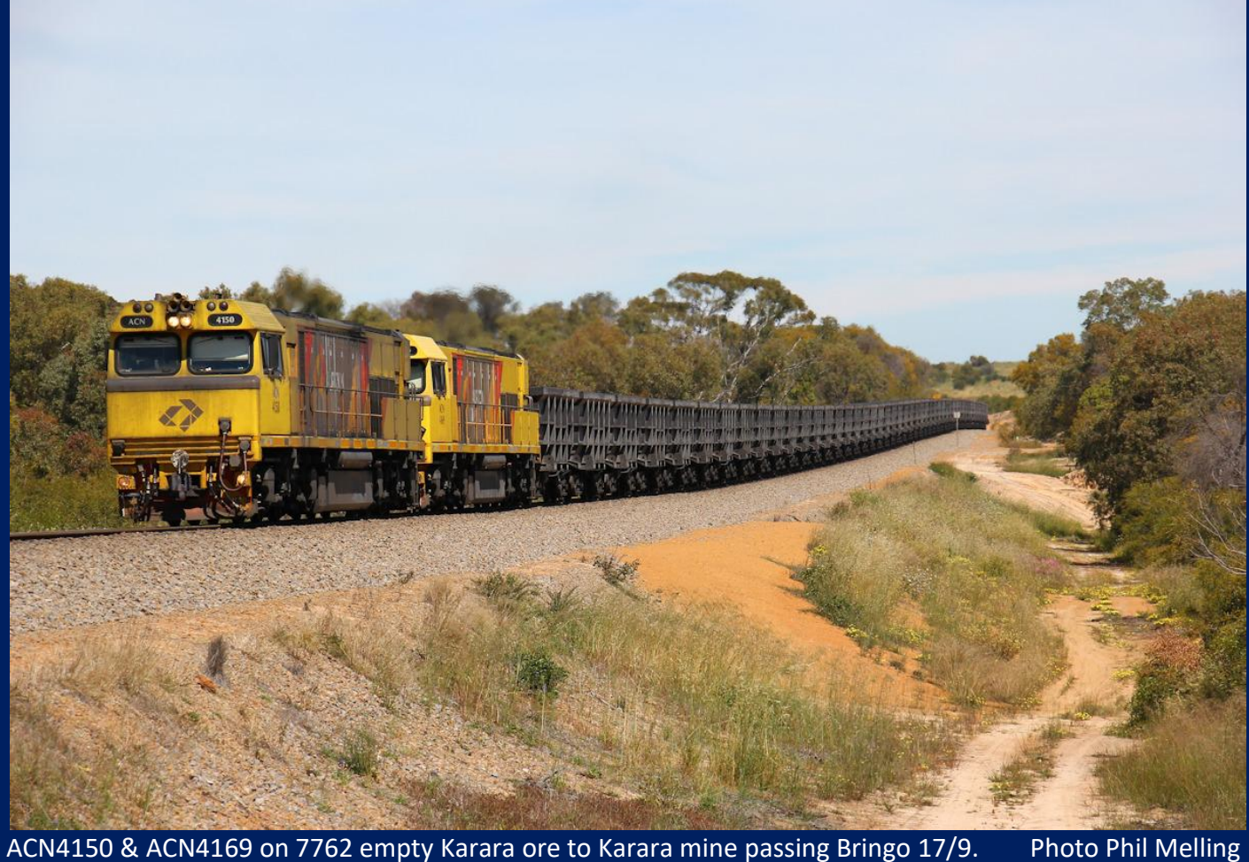
ACN4150 & ACN4169 on 7762 empty Karara ore to Karara mine passing Bringo 17/9.