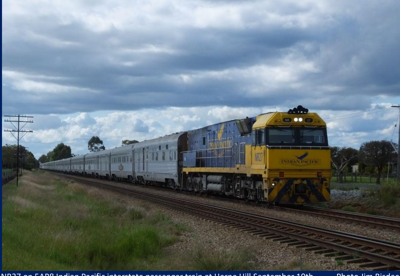
NR27 on 5AP8 Indian Pacific interstate passenger train at Herne Hill September 10th.