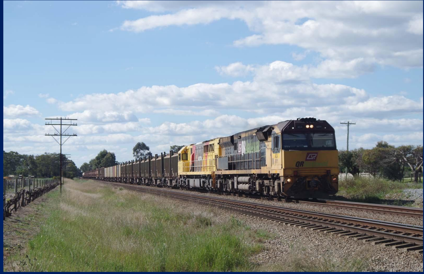
ACA6011 last ACA on its last run before converted back to 6000 to run on intermodal services & Q4002 on 5430 empty sulphur from Malcolm at Herne Hill September 16th.