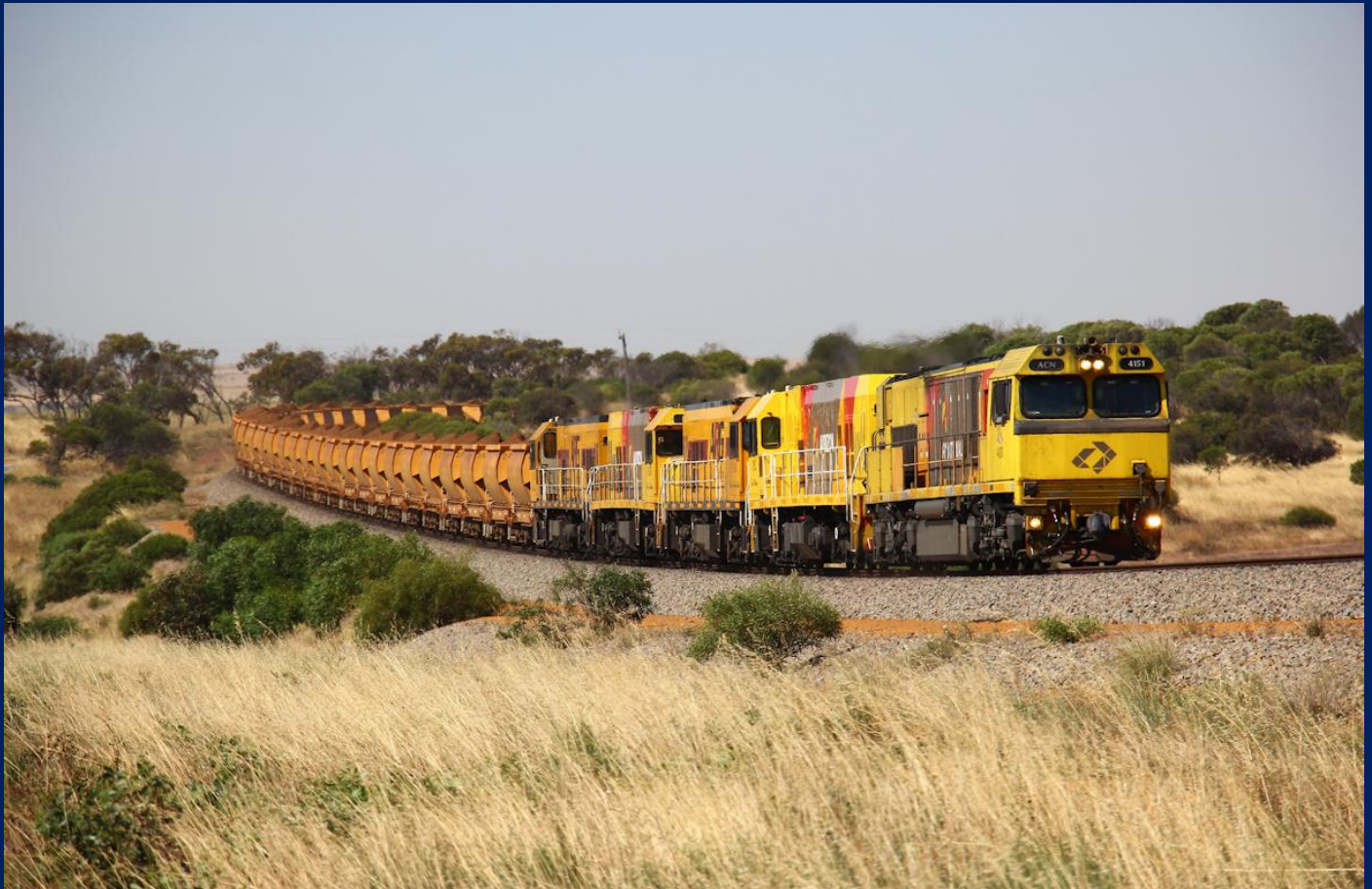
ACN4151, 2512, P2514, P2504 & P2501 on 6721 Mt Gibson ore P2514, P2504, P2501 had stalled on climb through Wicherina were rescued now climbing bank at Moonyoonooka 4/11.