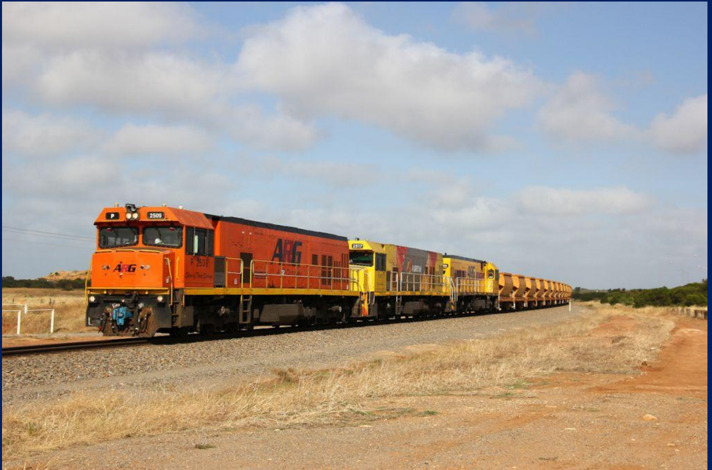
P2509, P2517 & P2508 on 5720 Mt Gibson ore ex Geraldton port arriving Narngulu 3/11.