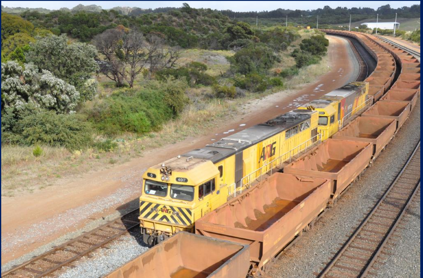
Q4017 & Q4001 on 5415 Portman ore arriving at Esperance passing empty rake 11/11.