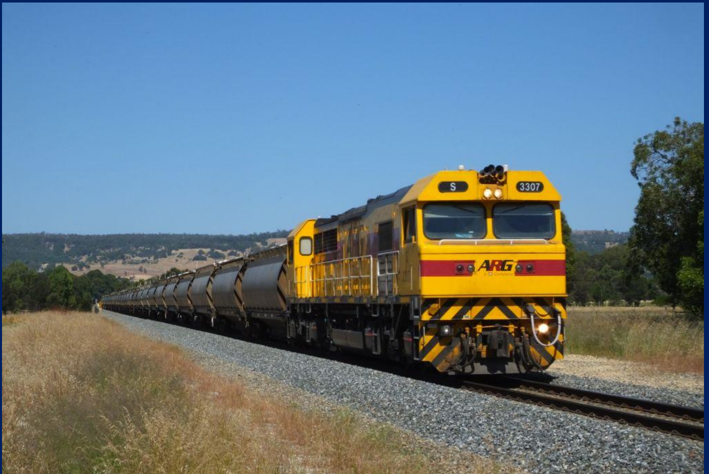
S3307 on 6222 Calcine to Kwinana alumina at Mundijong November 25th.