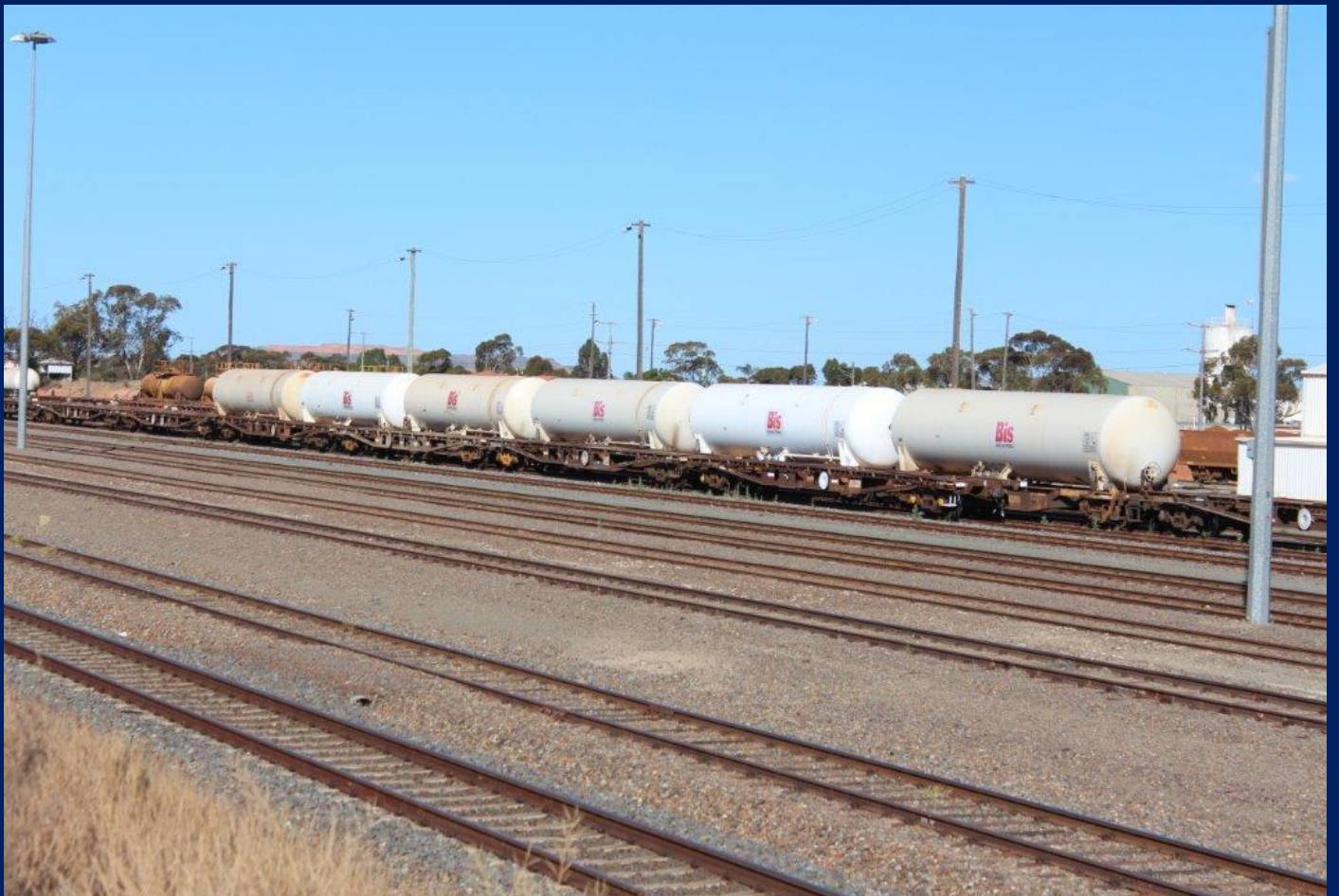
Ammonia tankers waiting to be shunted onto 426 freight November 1st.