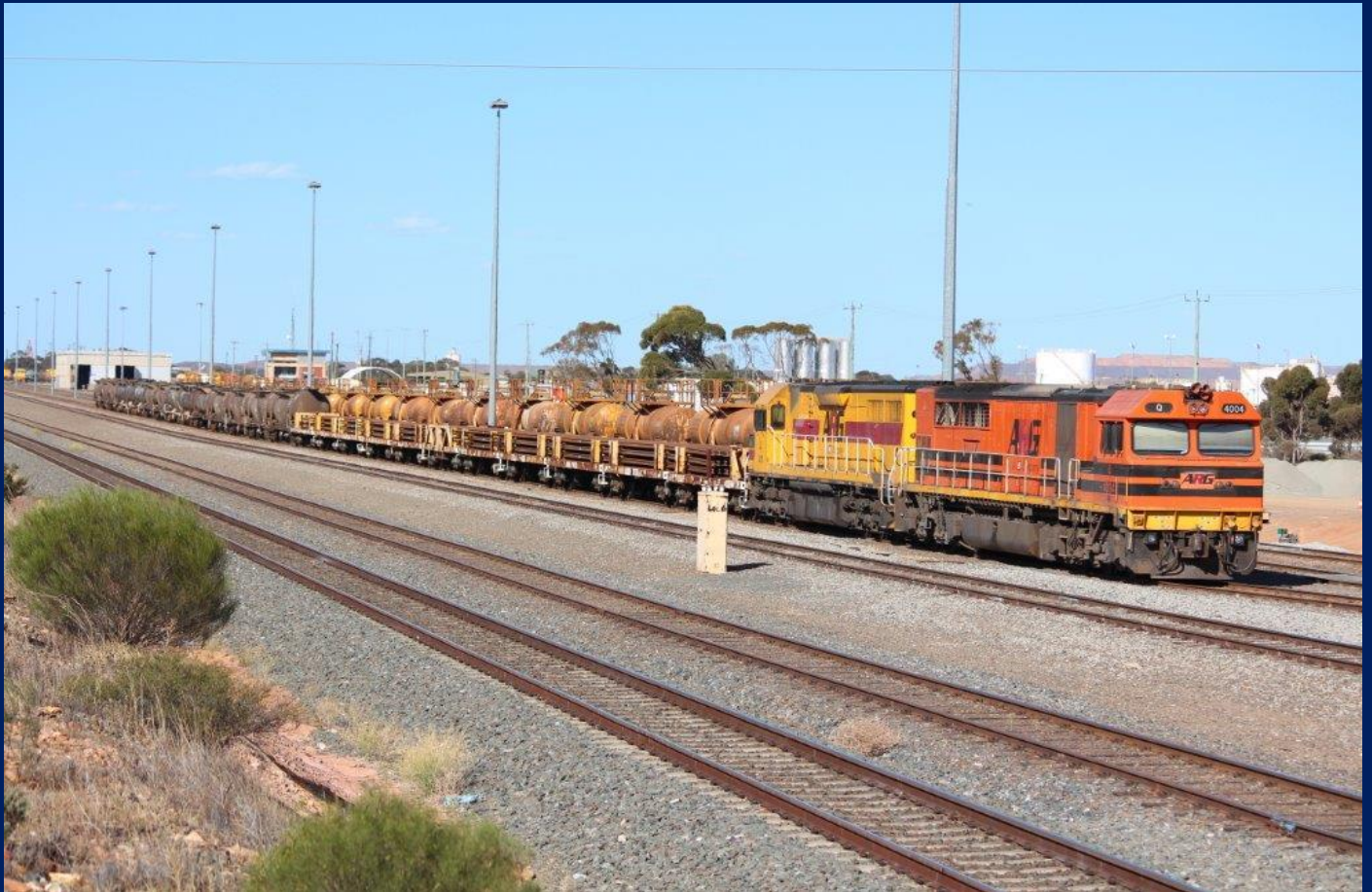
Q4004 & LZ3112 on 4443 Esperance freight with rail train and empty tankers West Kalgoorlie 2/11.