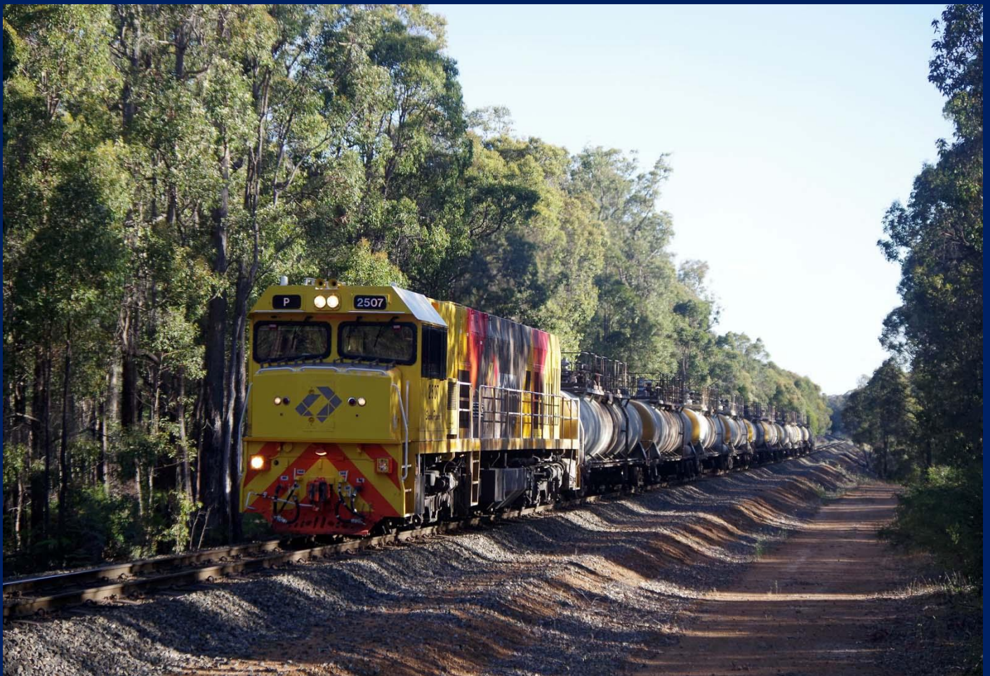
P2507 on 1853 caustic tankers Worsley November 20th.