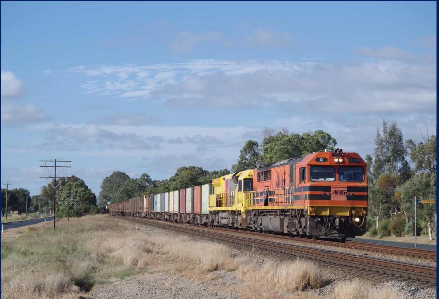
Q4009 & ACB4406 on late 7430 empty sulphur Herne Hill November 6th.