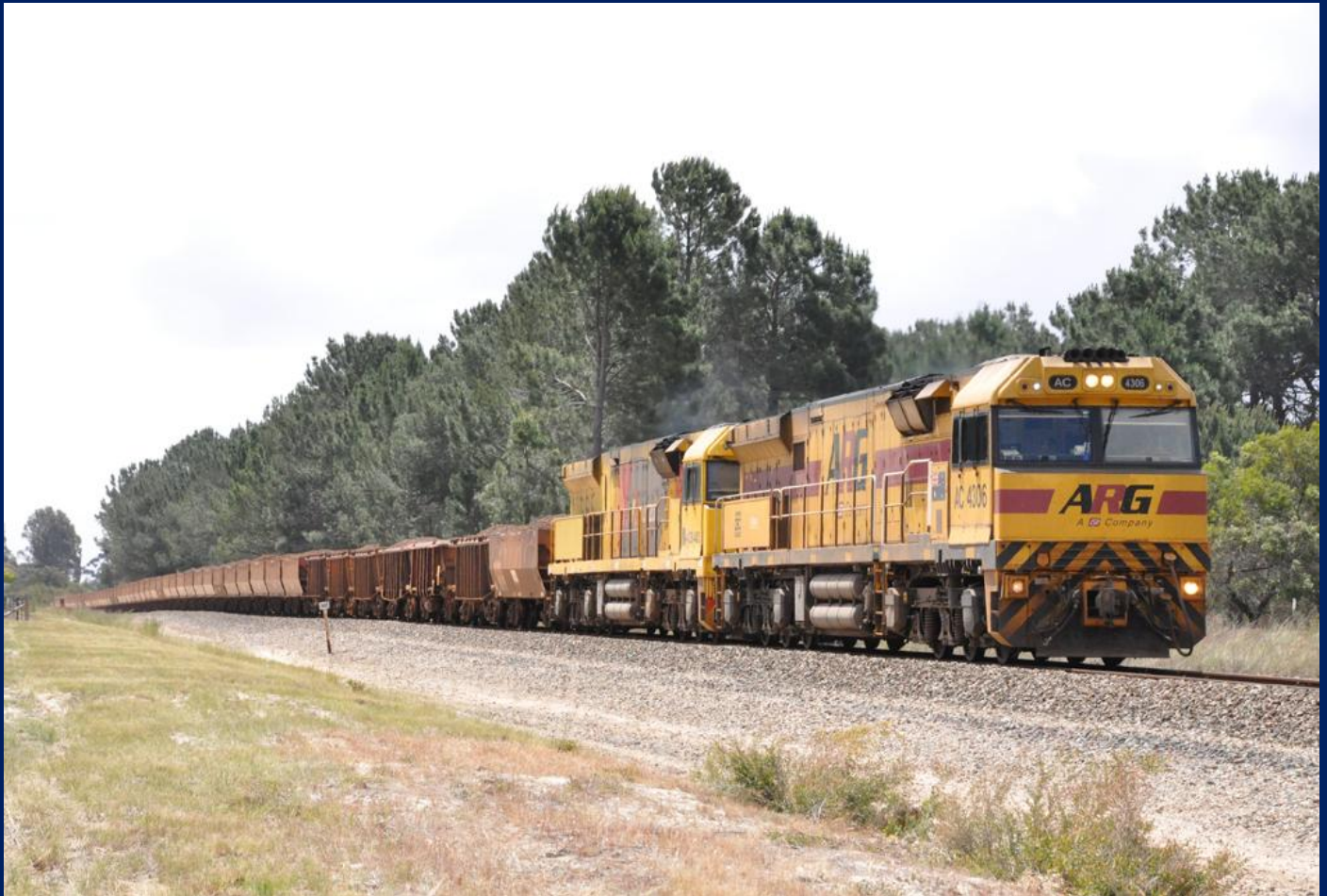
AC4306 & ACB4403 on 6417 Portman ore running through Gibson November 11th.