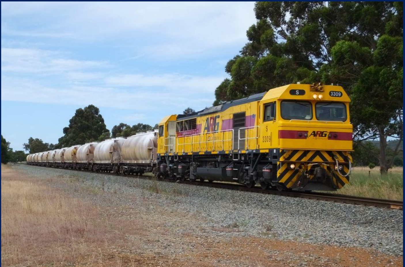
S3309 on 2271 Soundcem to Worsley lime train at Keysbrook November 21st.