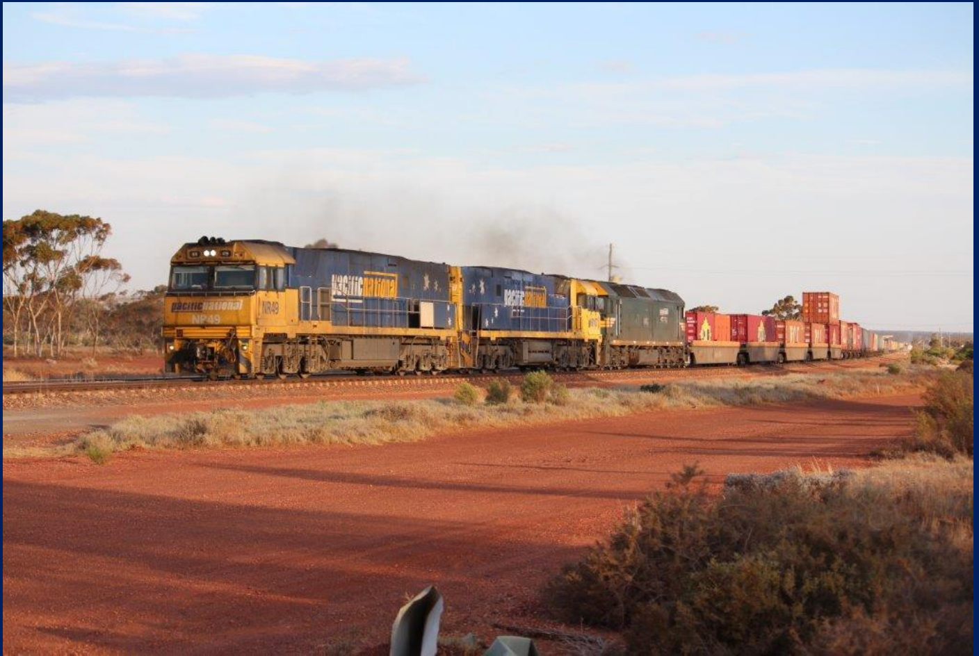
NR49, NR107 & G538 on 7SP7 Pacific National Sydney Perth express entering Parkeston November 6th.