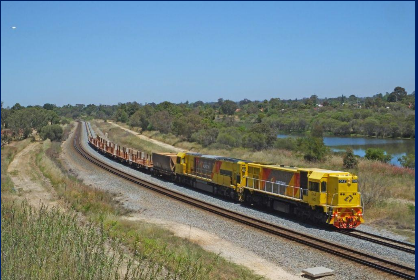
DAZ1901 & ACN4143 with XC wagon and empty rail train Wattle Grove 2/11.