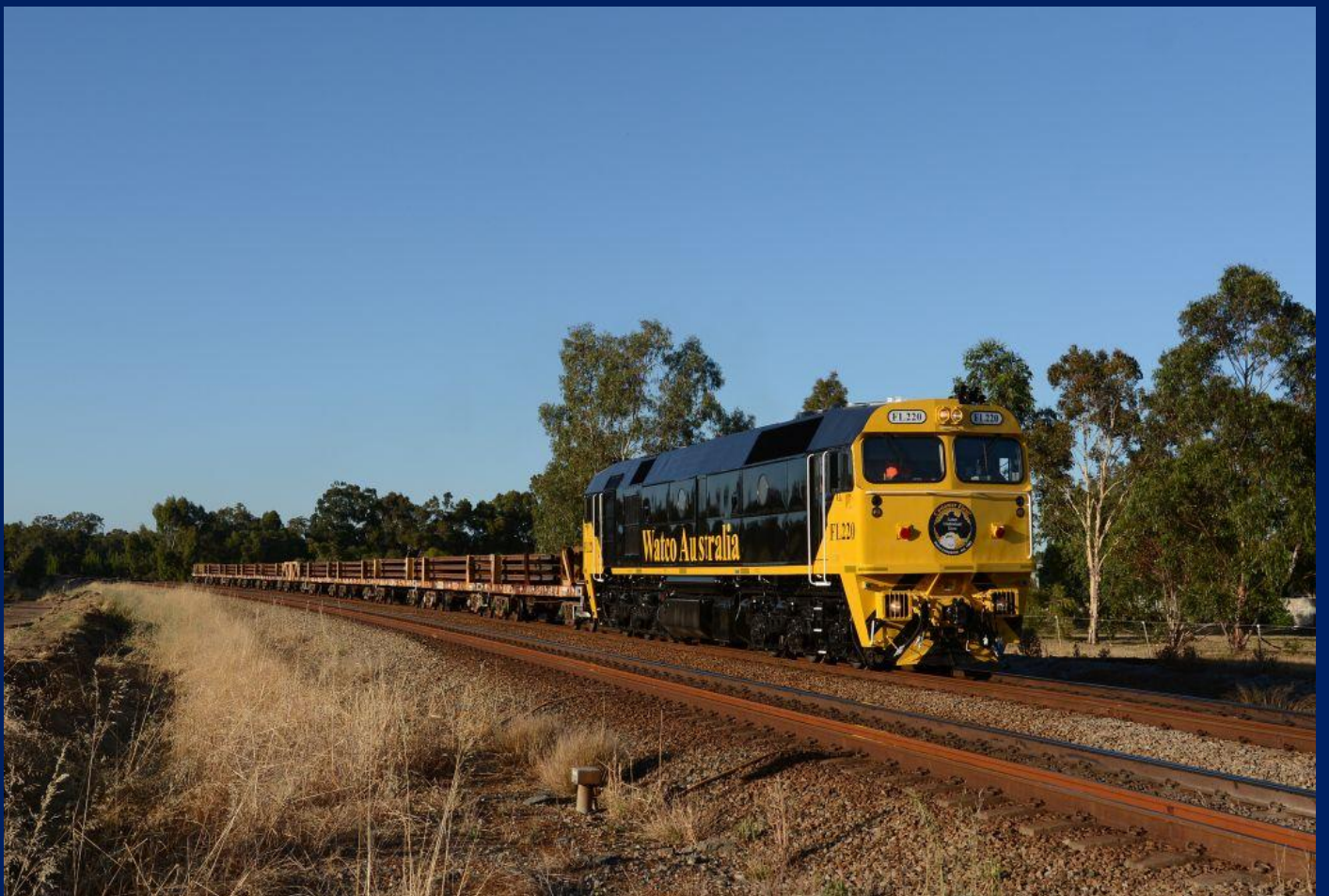
FL220 on 3RT1 rail train at Baskerville November 15th.