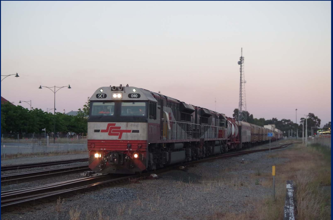
SCT010 & SCT004 on late 3PG1 SCT freight to Parkes at Midland November 23rd.