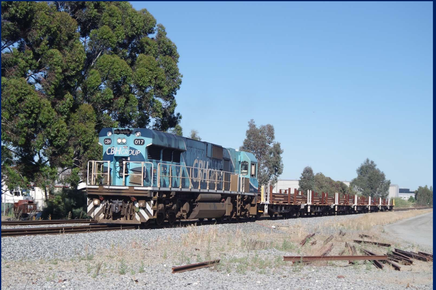
CBH017 on 7RT1 Watco rail train November 5th.