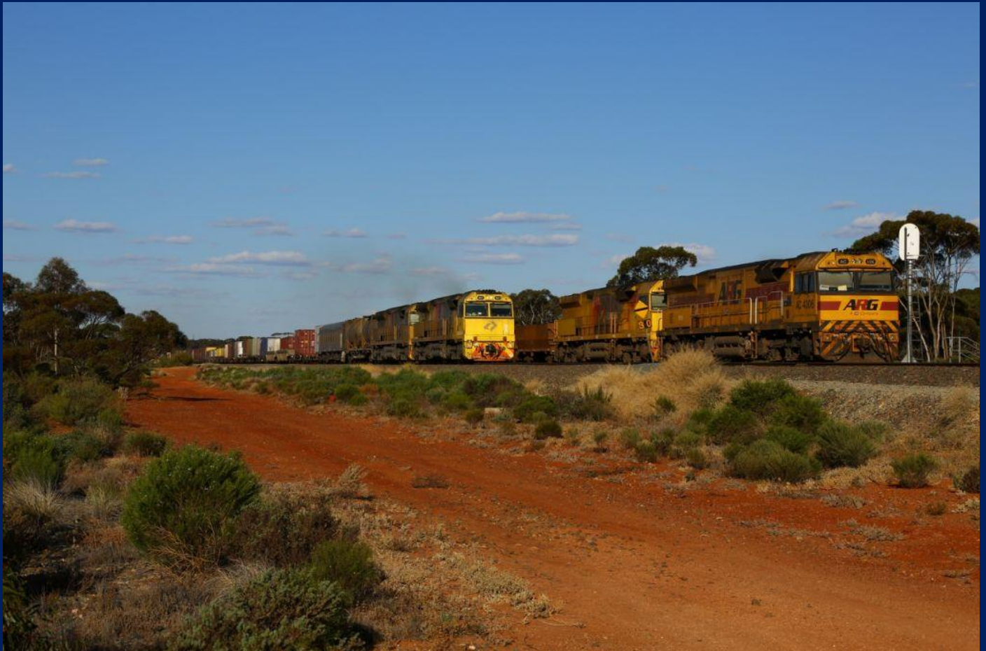
6021 & 6029 on 3MP1 intermodal bypasses AC4306 & ACB4403 on 5416 empty ore at Binduli 10/11.