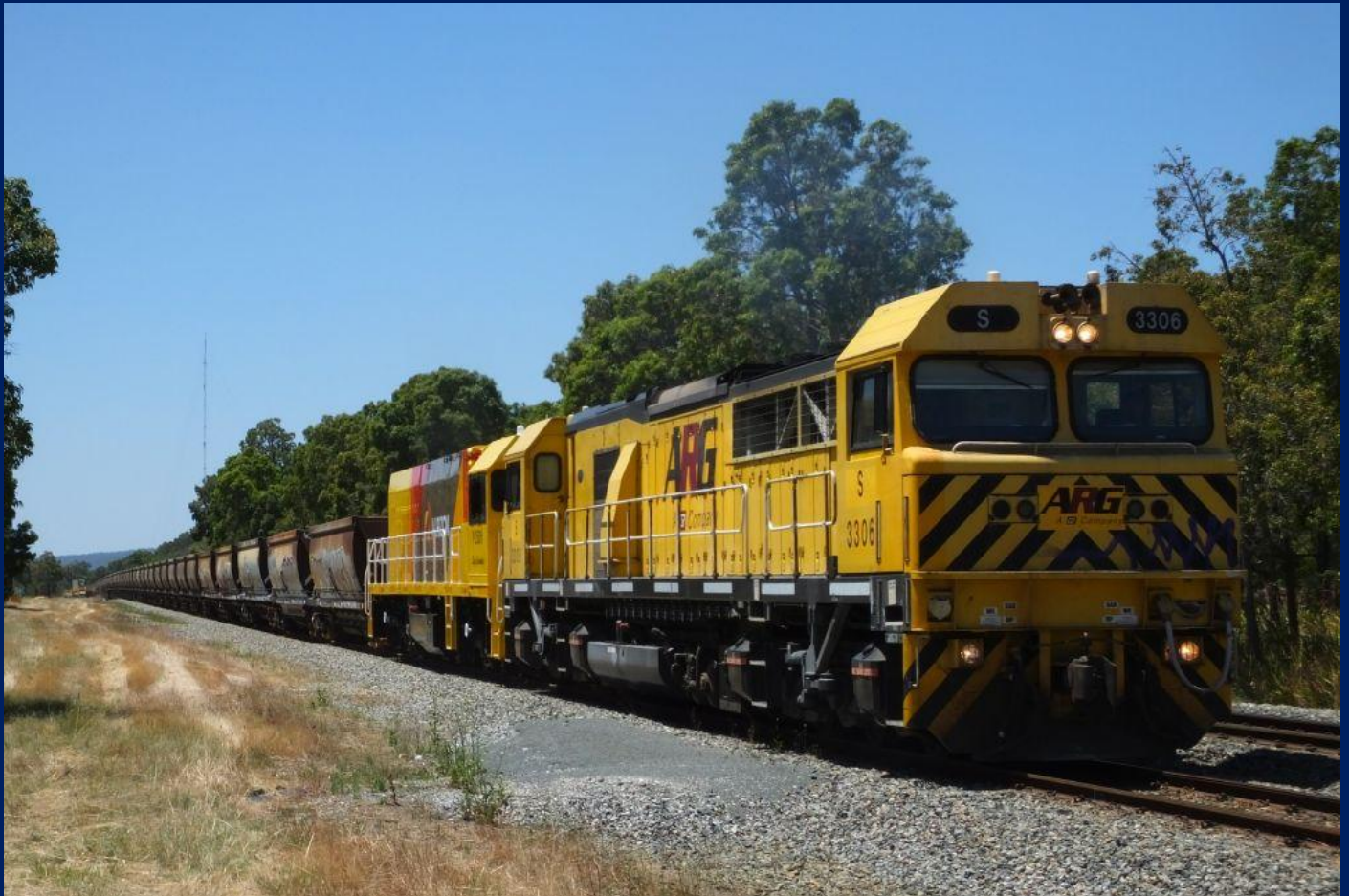
S3306 & P2506 on 6943 bauxite trial with six extra XG wagons Mundijong 25/11.