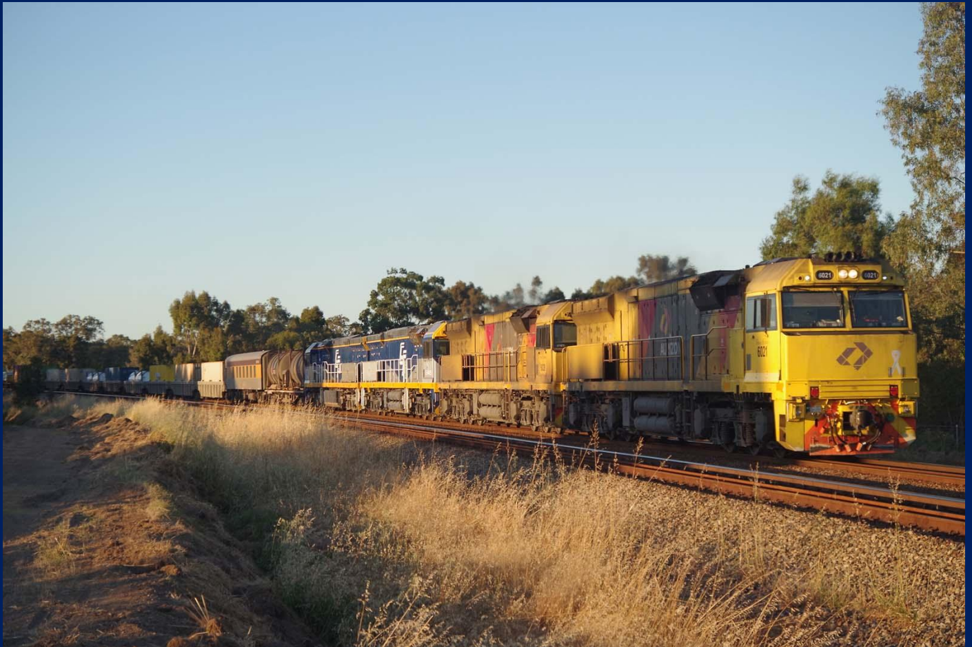
6021, 6029, CF4409 & CF4401 on 7PM1 Aurizon intermodal Millendon Junction 5/11.