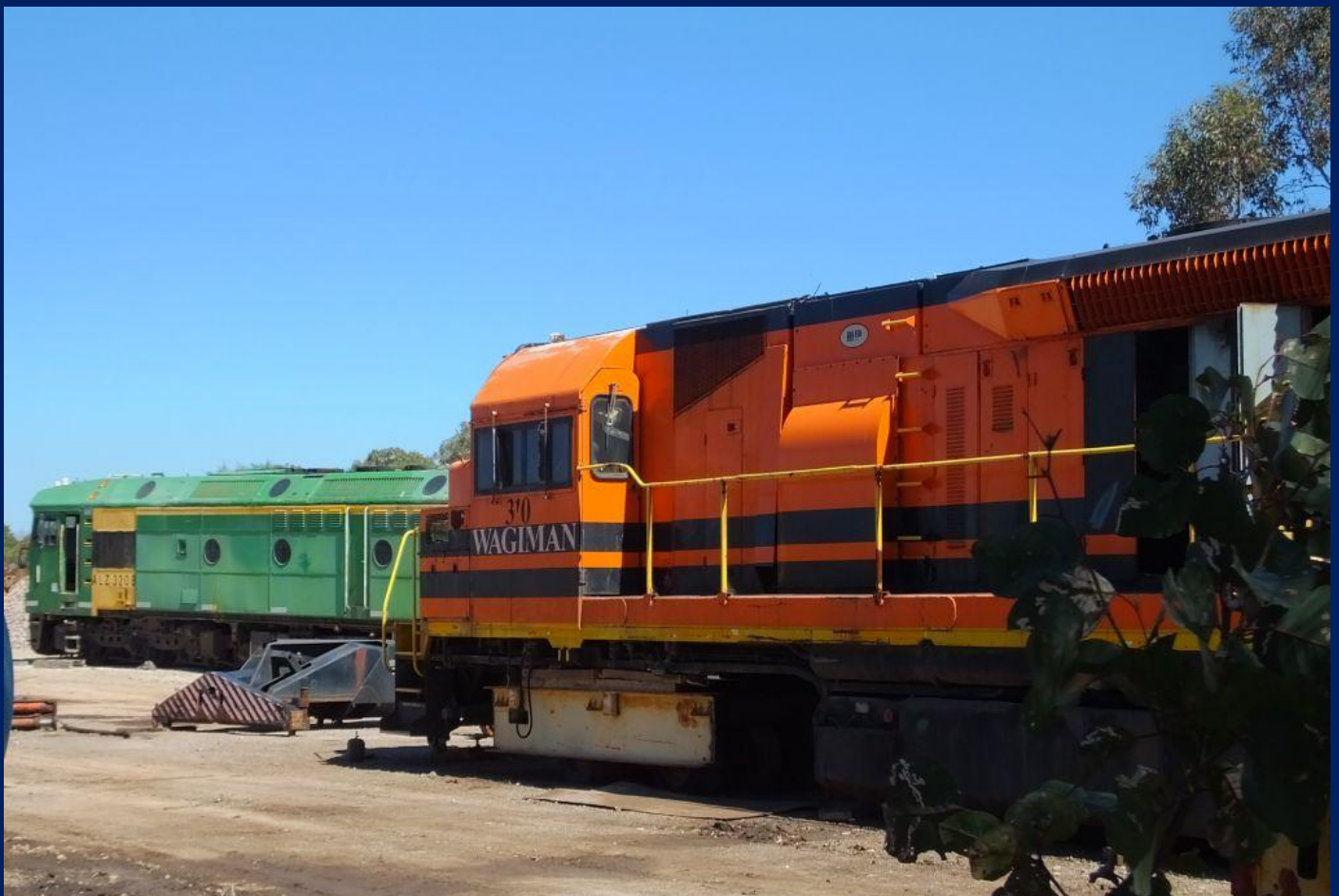
3102 and ALZ3208 in J&P Metals scrap yard Dardanup November 5th.