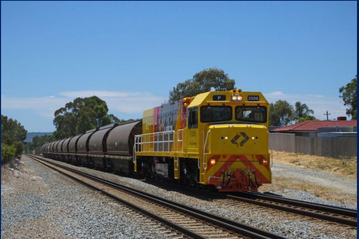
P2506 on 4112 empty XT wagon movement Forrestfield to Kwinana Thornlie 23/11.