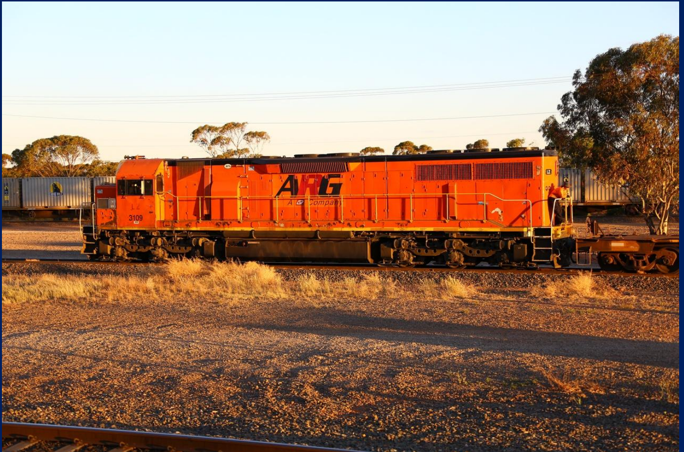
LZ3109 shunting and making up 426 overnight freight West Kalgoorlie 10/11.