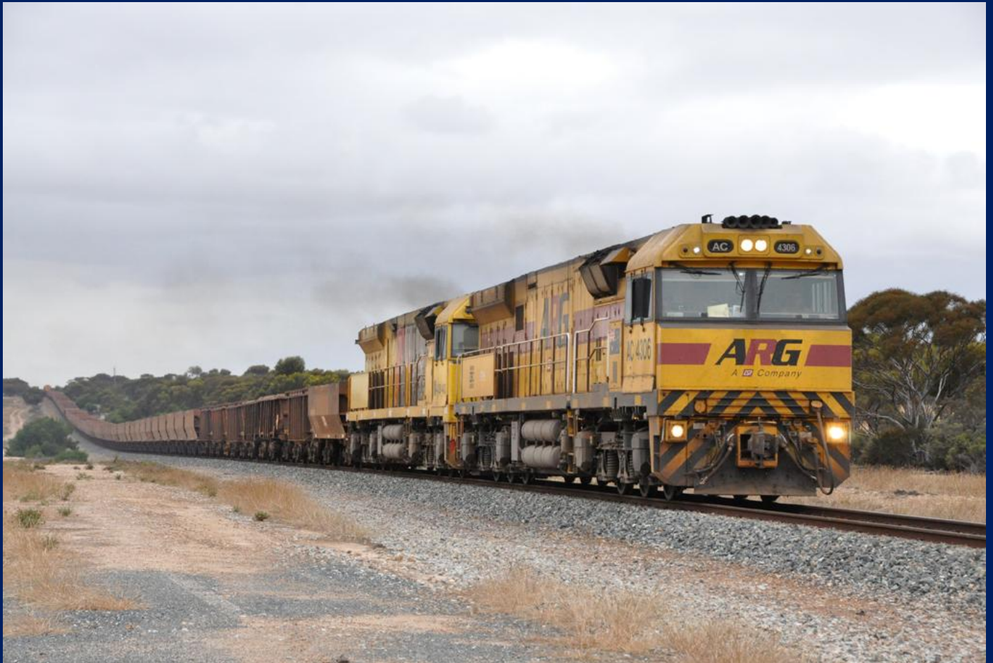
AC4306 & ACB4403 on 5416 empty Portman ore approaching Salmon Gums on 10/11.