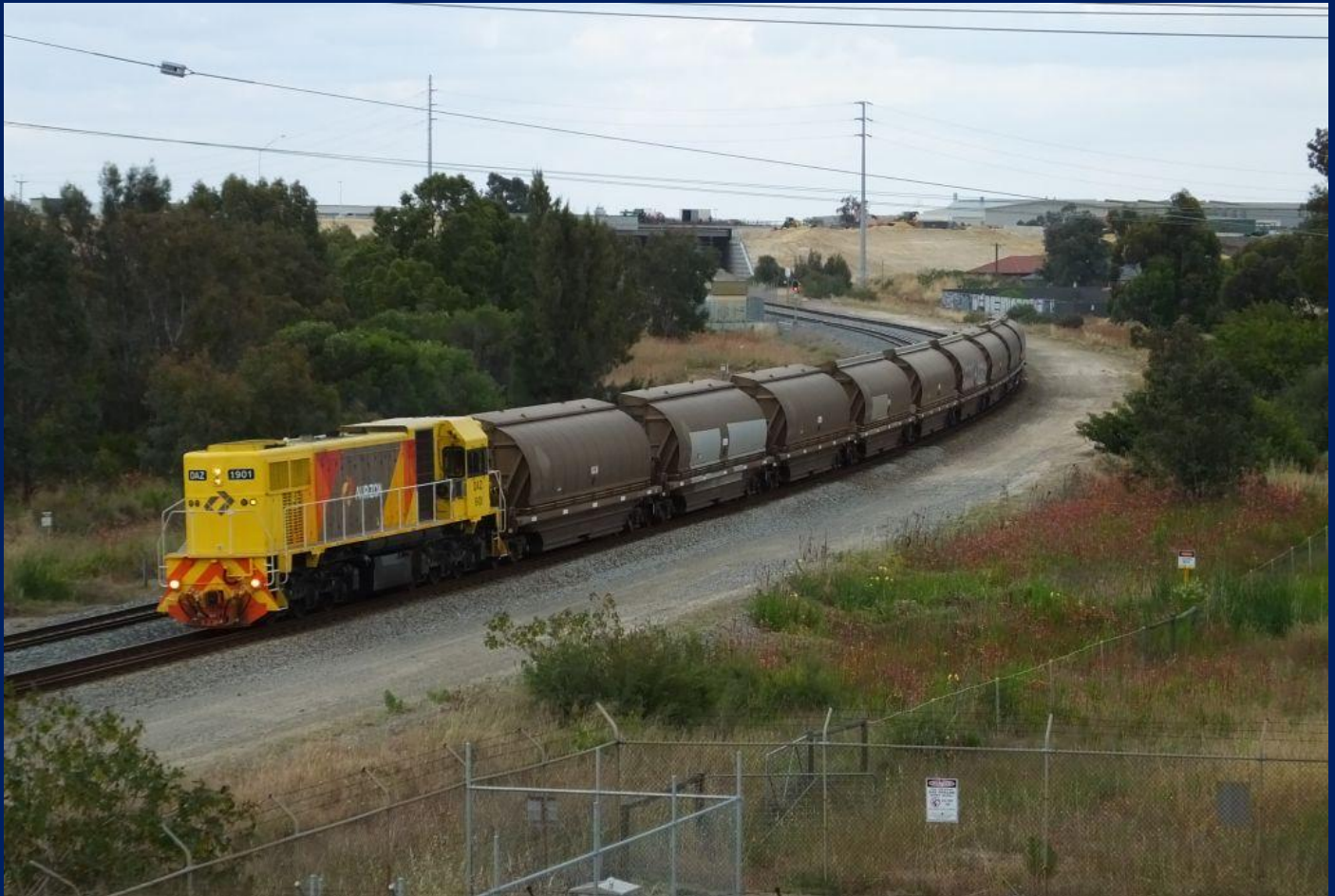
DAZ1901 on 4112 empty XT grain wagon movement to Kwinana at Wattle Grove 9/11.