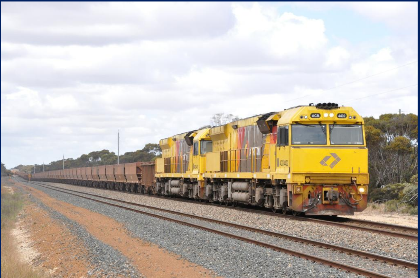
ACB4402 & ACB4401 on 7414 empty Portman ore heading through Grass Patch 12/11.