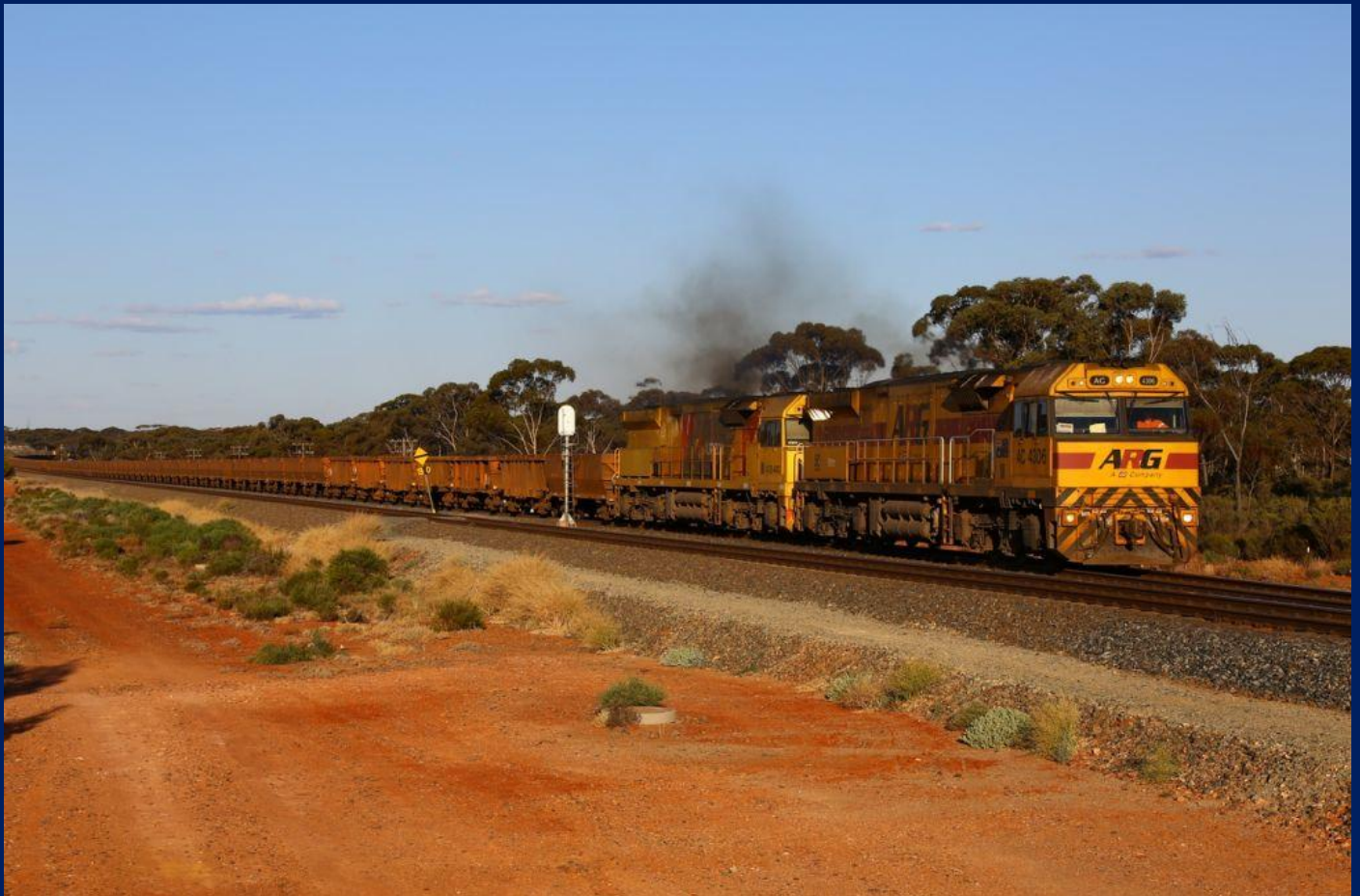
AC4306 & ACB4403 on 5416 empty Portman ore departing Binduli 10/11.