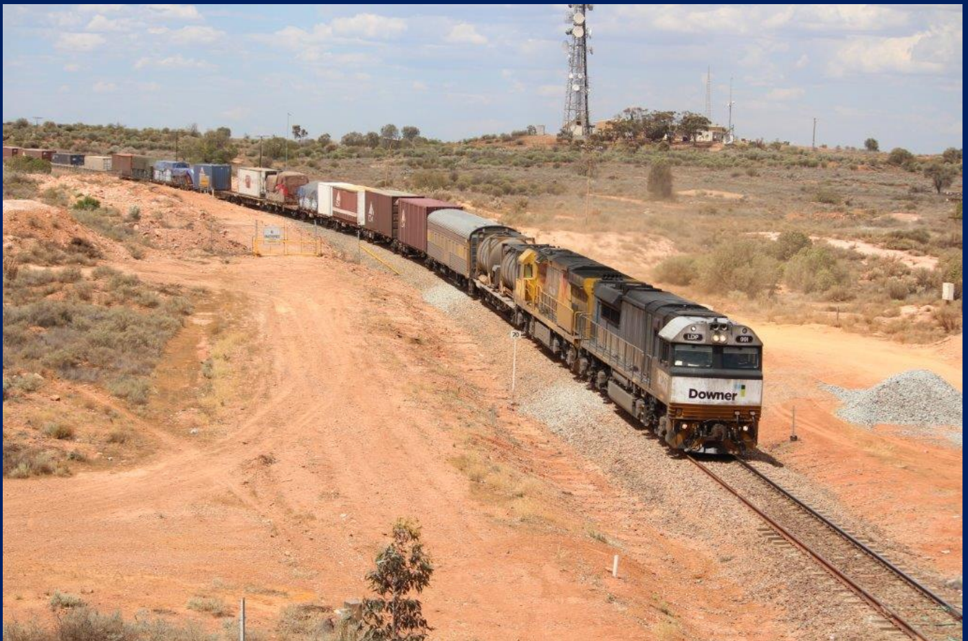
LDP001 & 6024 on 6MP1 entering Brookfield territory at Kalgoorlie 5/11.