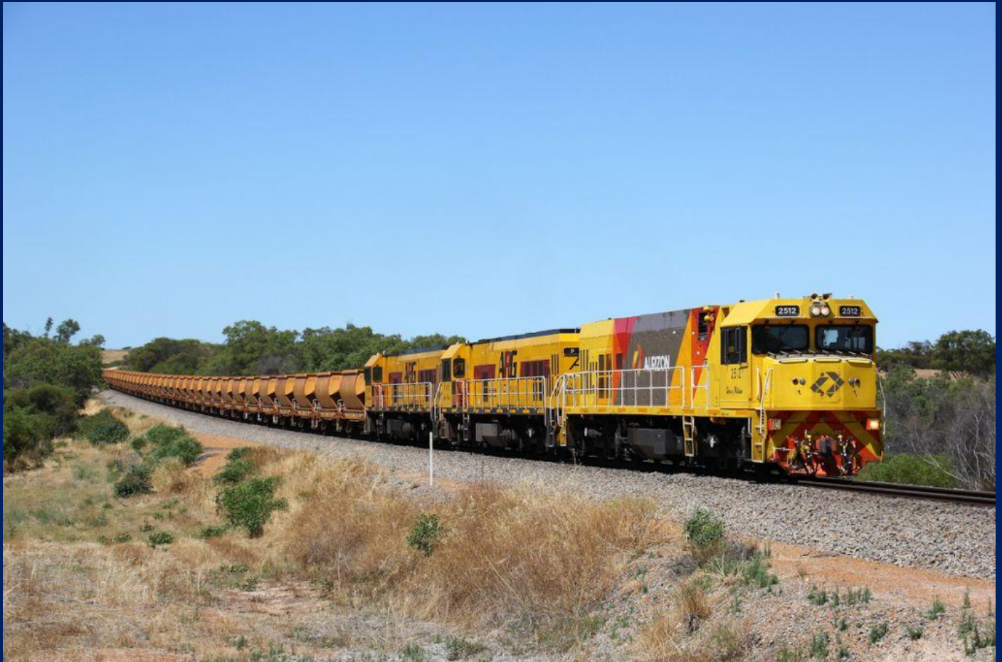
2512, P2502 & P2501 on 7720 empty Mt Gibson ore to Perenjori Bringo 26/11.