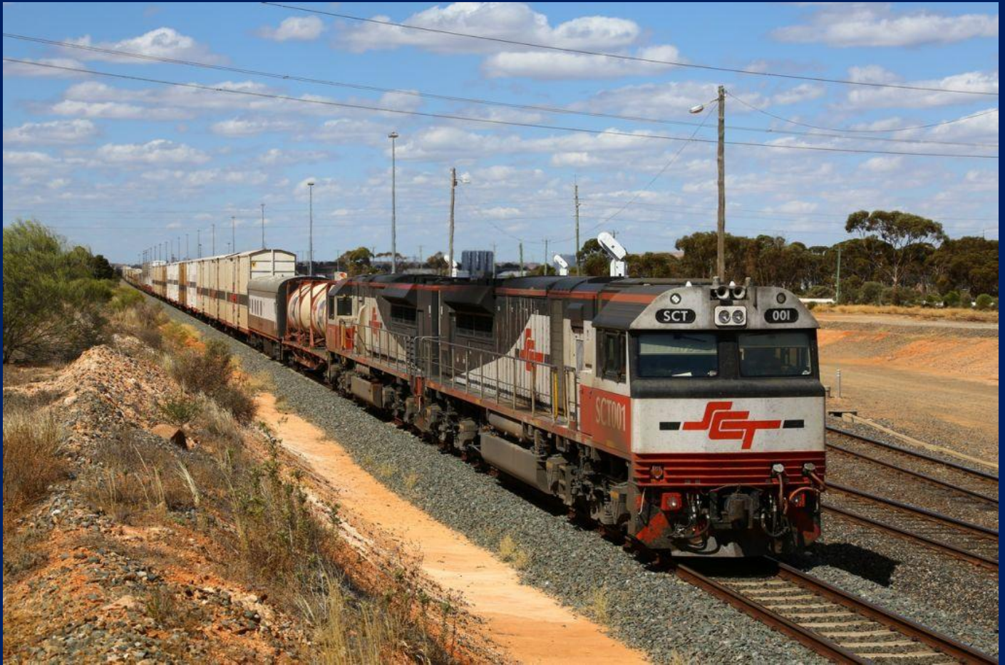
SCT001 & SCT011 on 3MP9 SCT freight arriving West Kalgoorlie November 10th.