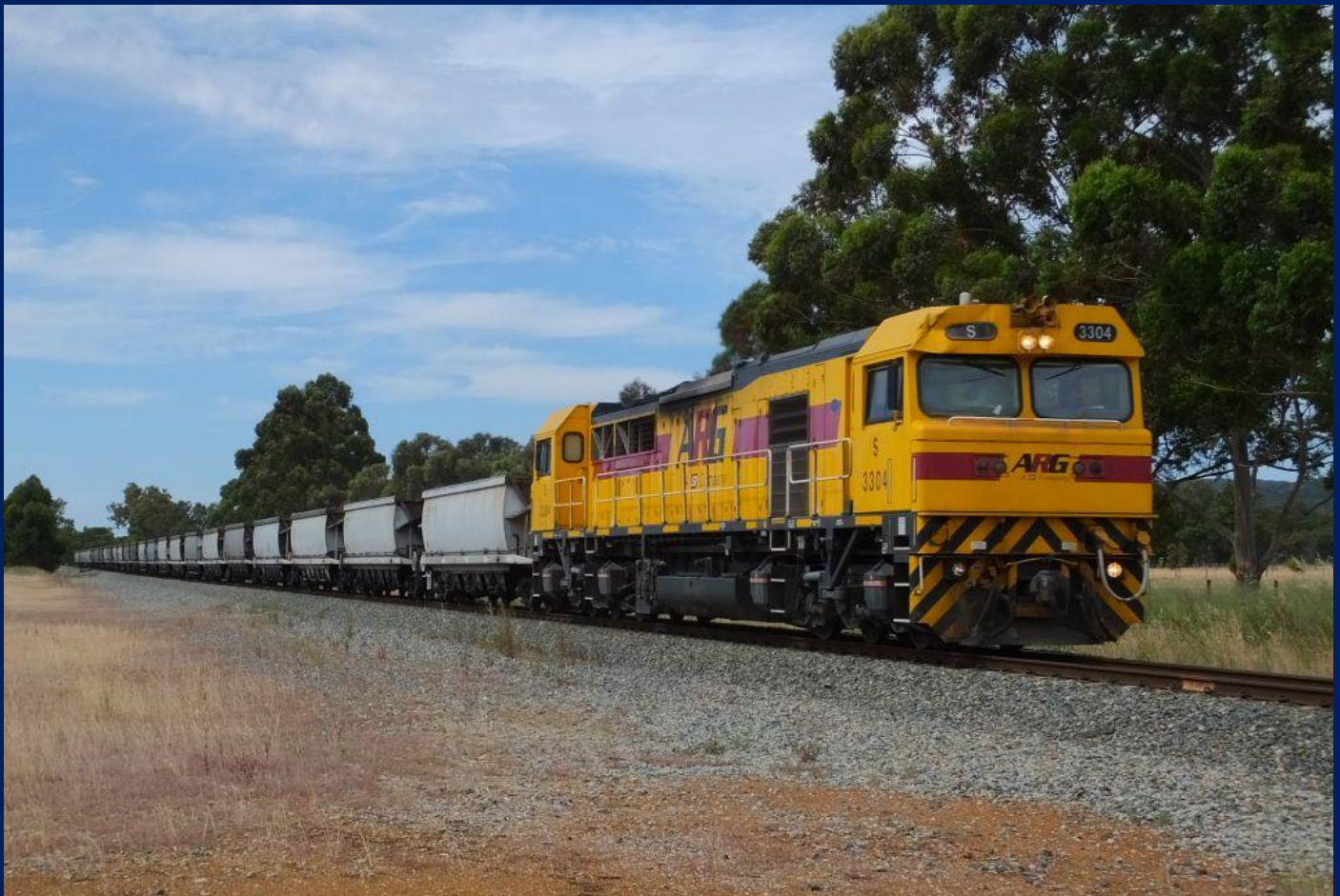
S3304 on empty coal Kwinana to Collie at Keysbrook November 21st.