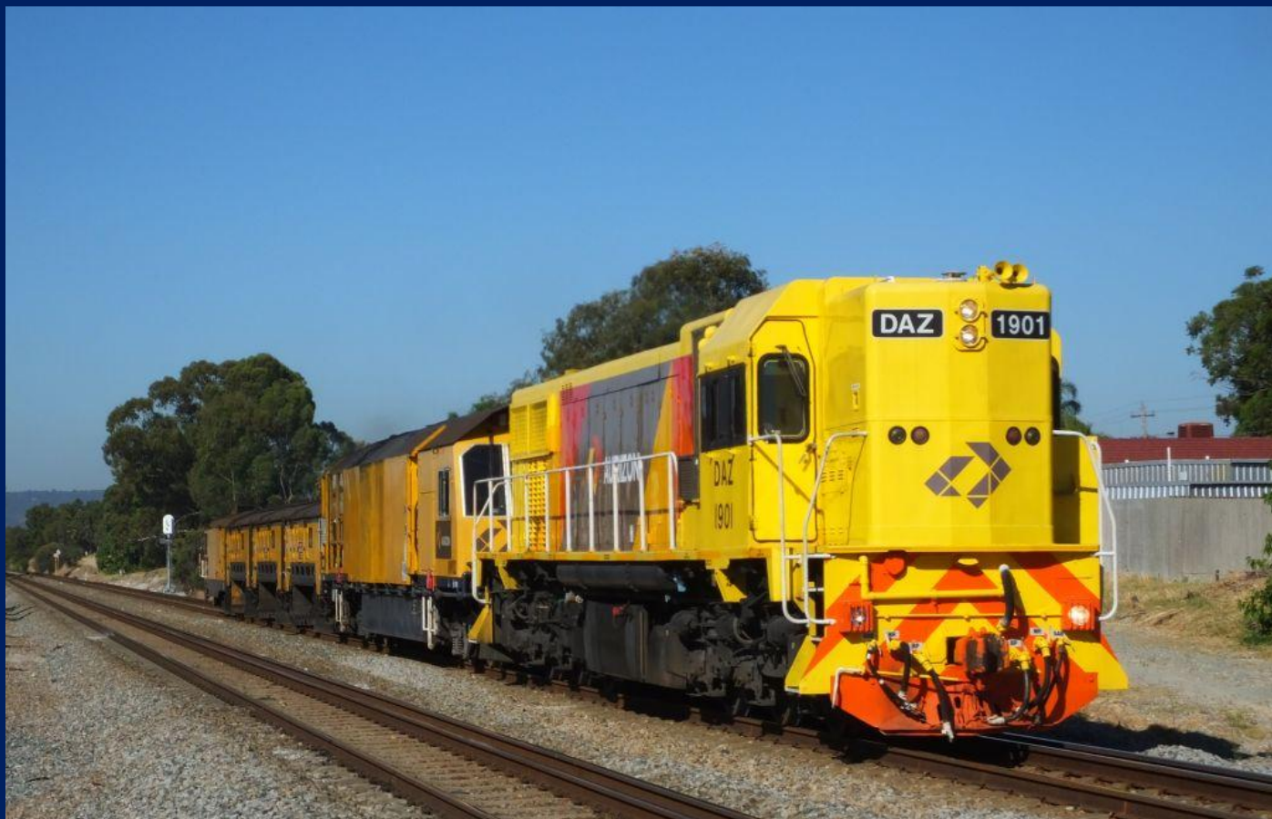
DAZ1901 on 2112 hauling MMY032 rail grinder to turn Kwinana triangle Thornlie 28/11.