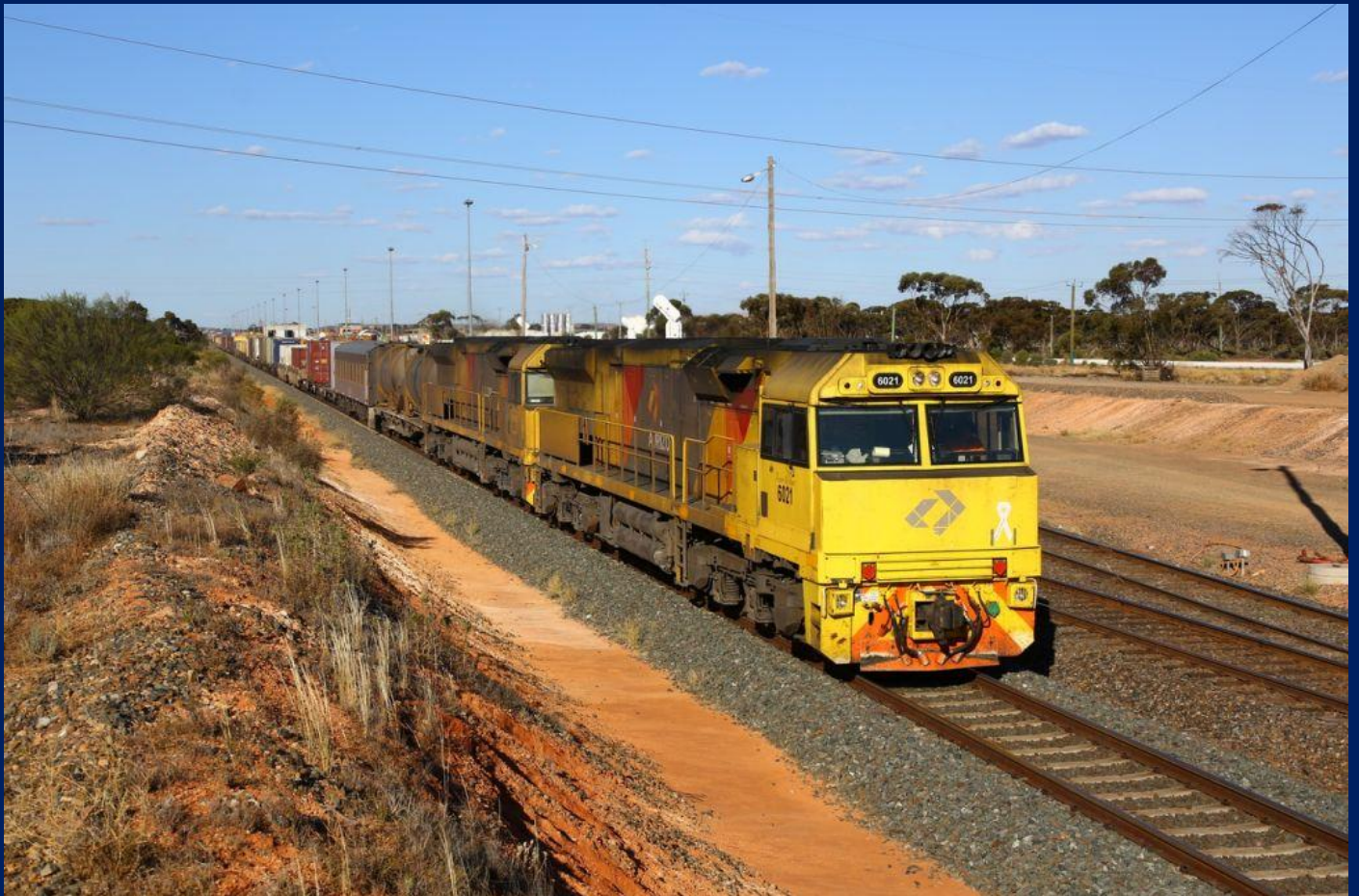
6021 & 6029 on 3MP1 Aurizon intermodal arriving West Kalgoorlie 10/11.