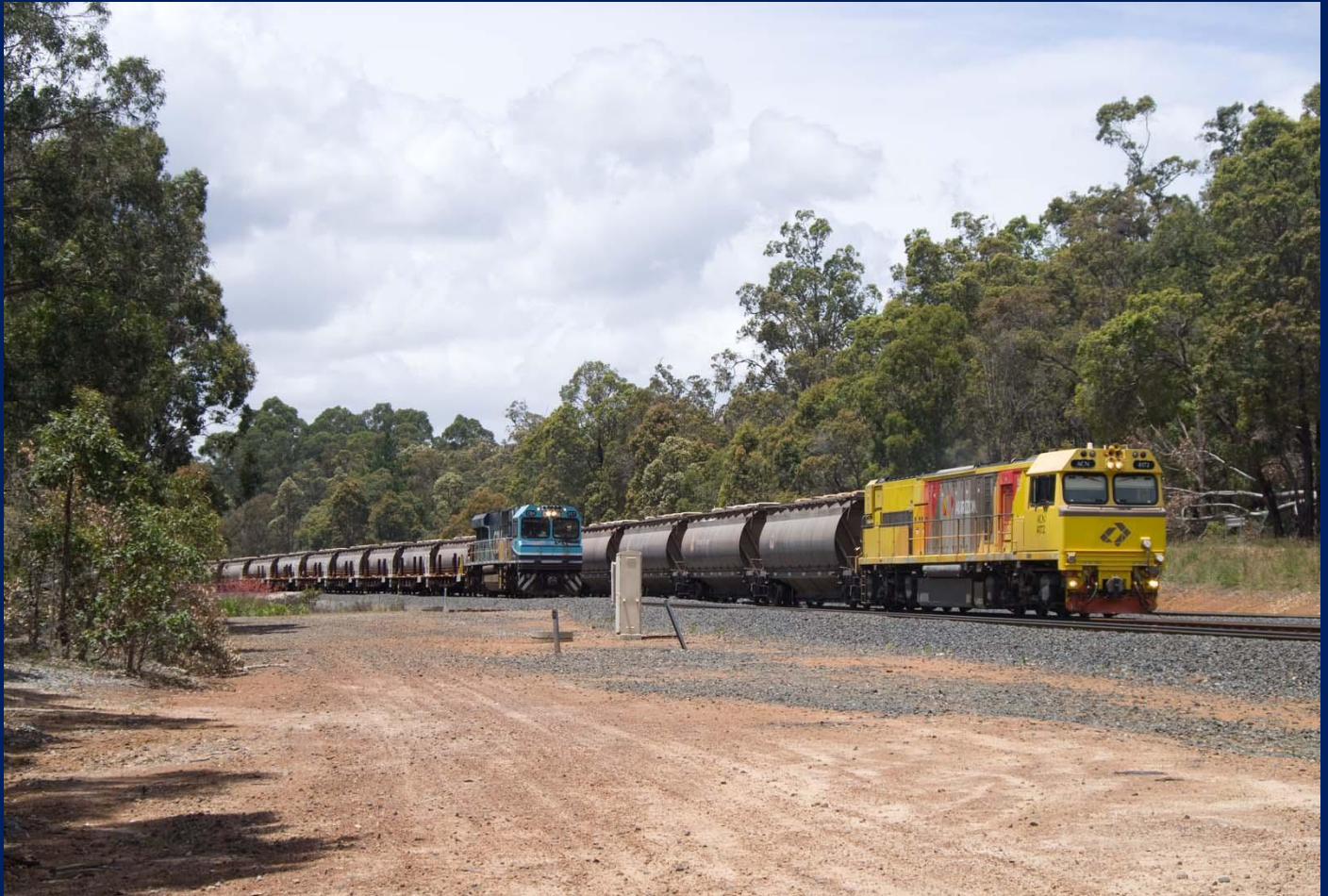
ACN4172 on 1842 alumina bypasses CBH017 on 1RT2 rail train Worsley 20/11.