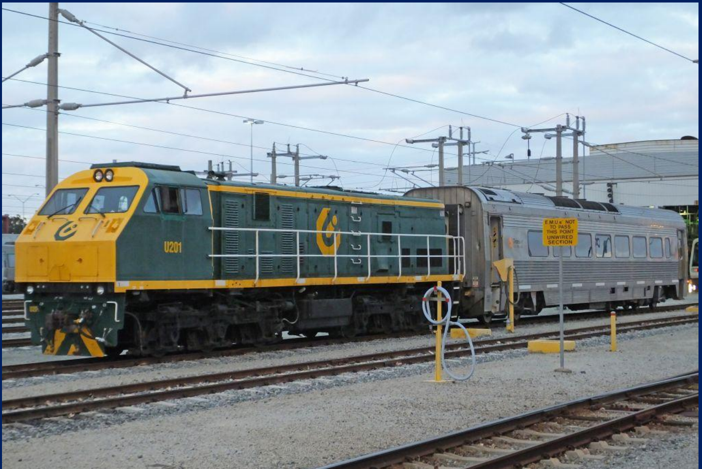
U201 with ADQ Australind trailer car at Claisebrook that it will haul to Nowergup 11/11.