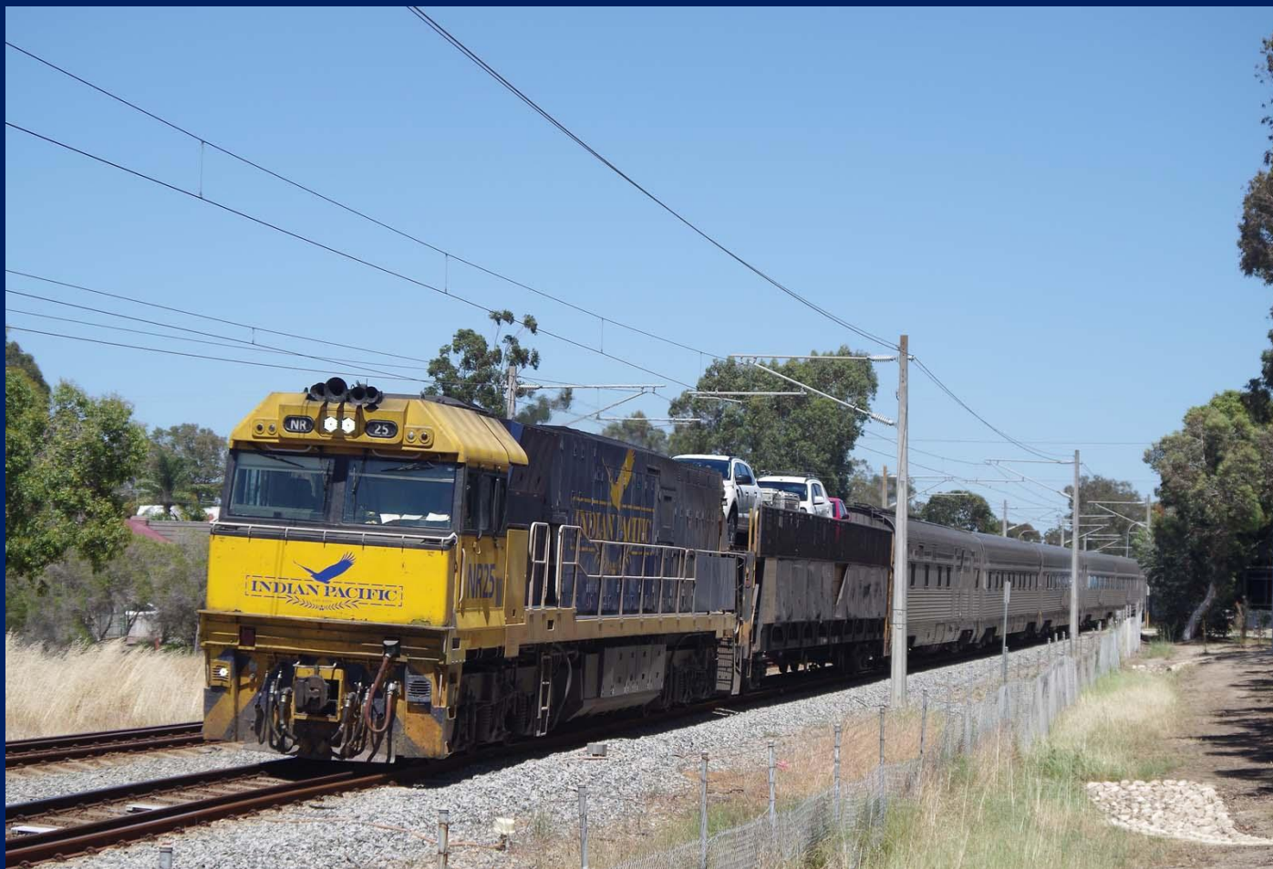
NR25 on 1PA8 Indian Pacific weekly interstate passenger at Woodbridge 13/11.