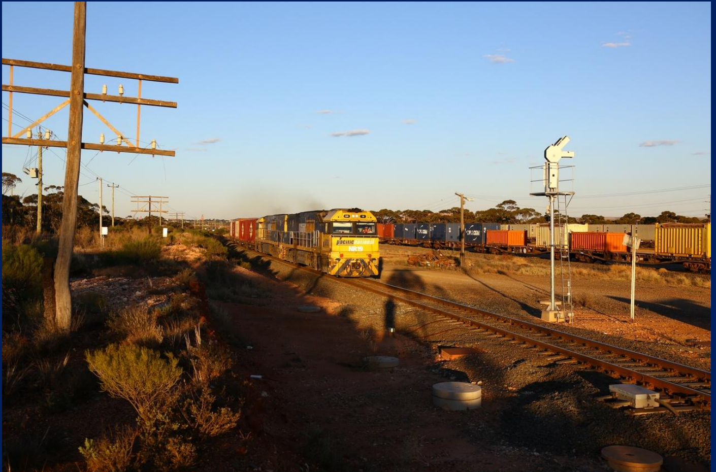
NR19 & NR87 on 3SP7 express arriving while 426 freight being made up 10/11.