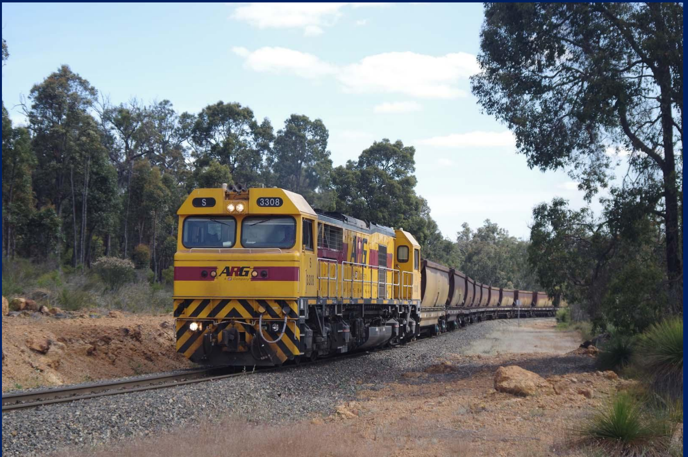
S3308 on 1595 empty coal to Ewington nearing the mine November 20th.