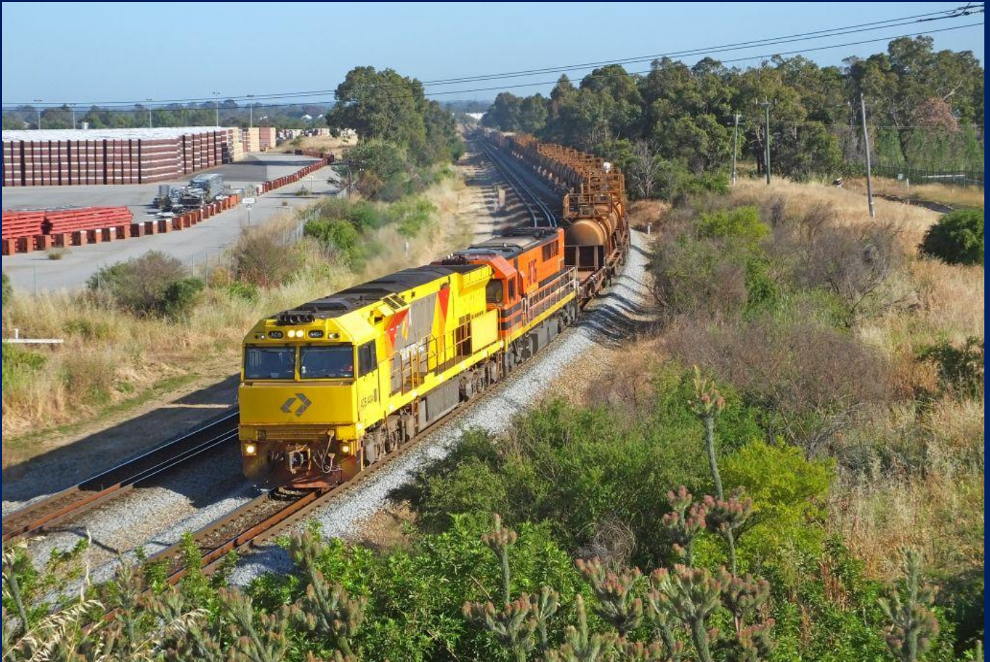
ACB4404 & Q4005 on 6426 freight Forrestfield at South Guildford November 12th.