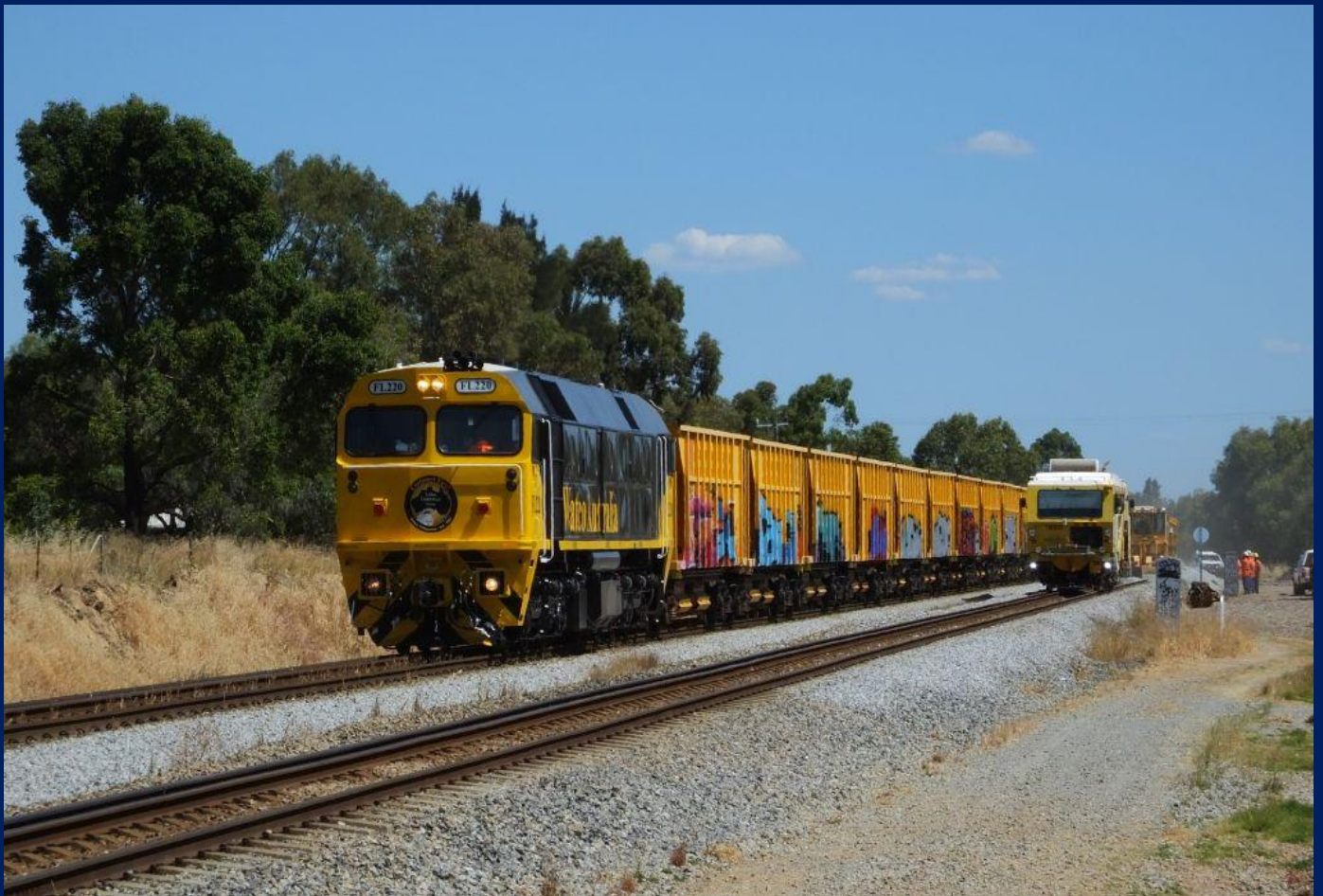
FL220 on 5BT1 running wrong line owing to track works on down main Hazelmere 24/11.