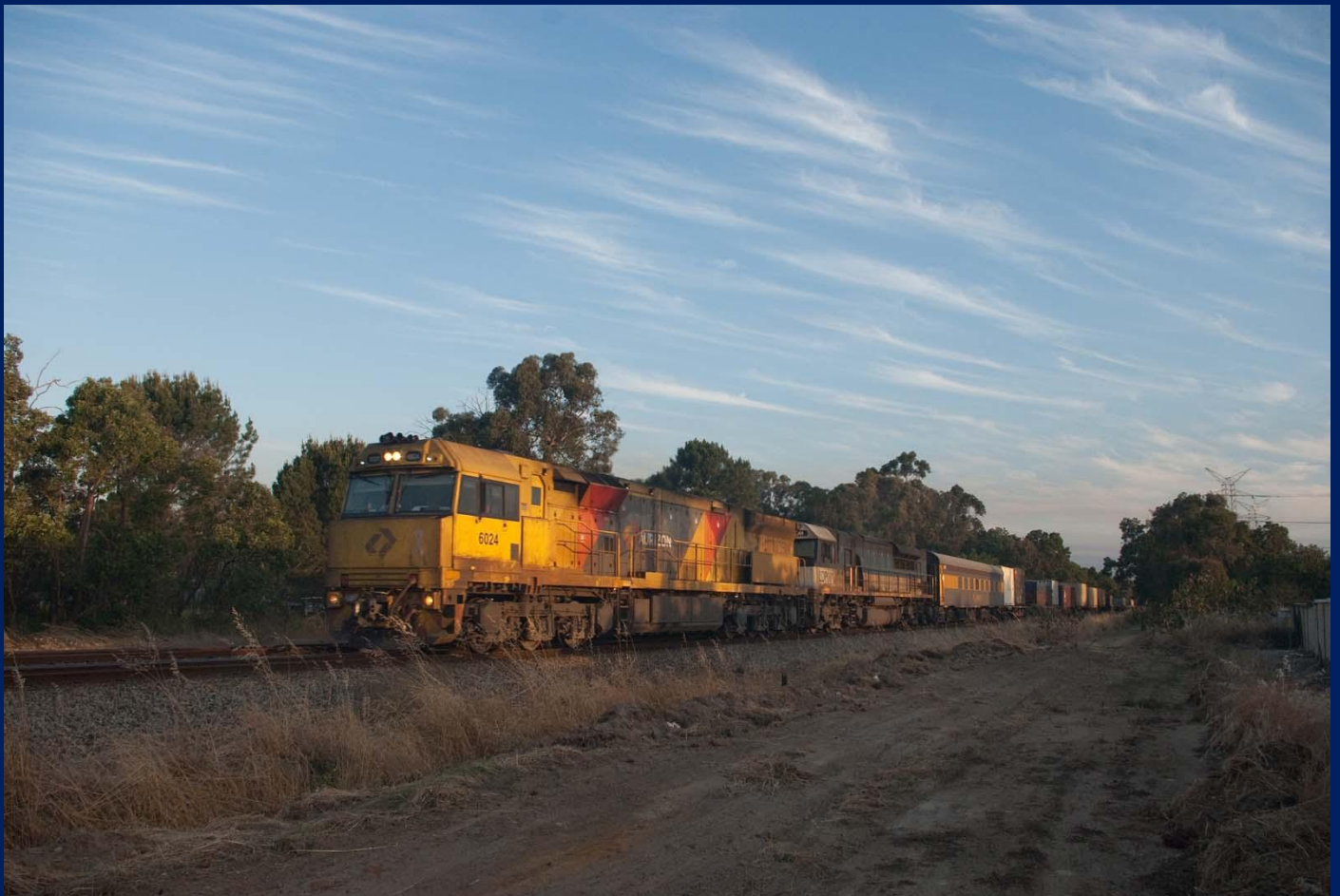
6024 & LDP001 on 2PM1 Aurizon intermodal at Swan View on November 7th.