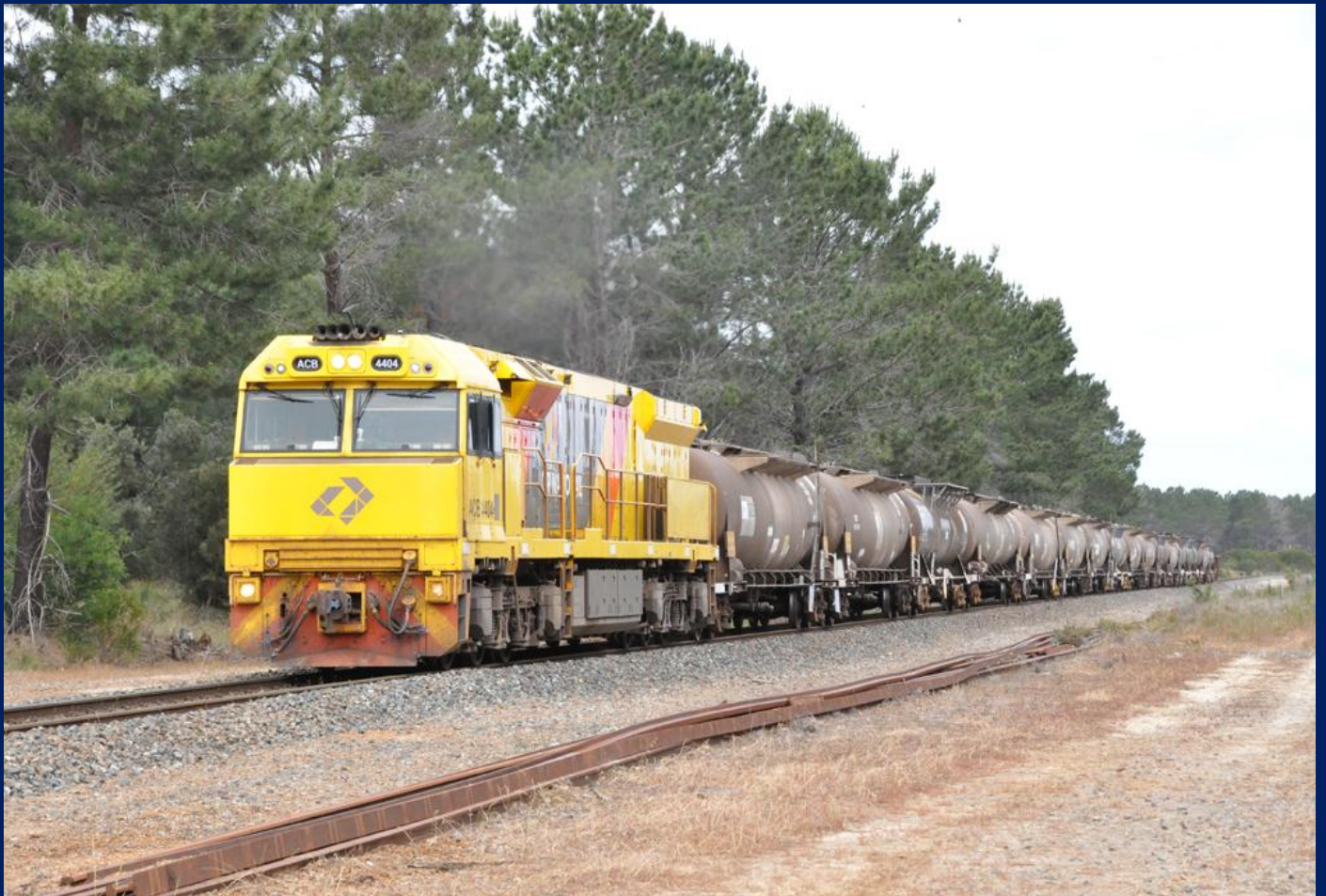
ACB4404 on 5442 Esperance Kalgoorlie freight heading through Gibson November 10th.