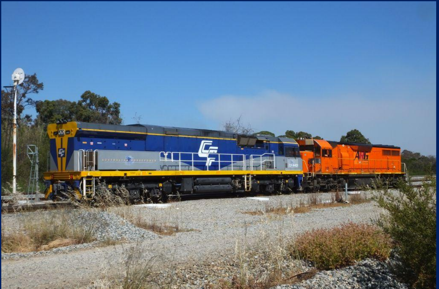
LZ3109 & CF4401 on 3154 locomotive transfer CF4401 from UGL Bassendean to Aurizon Forrestfield 1/11.