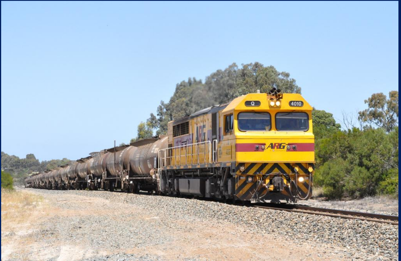
Q4010 on 1442 freighter heading through Shark Lake November 13th.