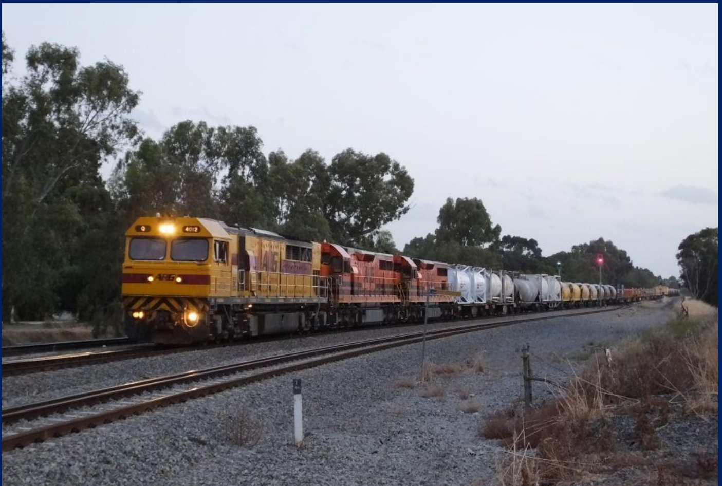
Q4012, LZ3107 & LZ3117 on 3025 Kalgoorlie freight Woodbridge November 15th.