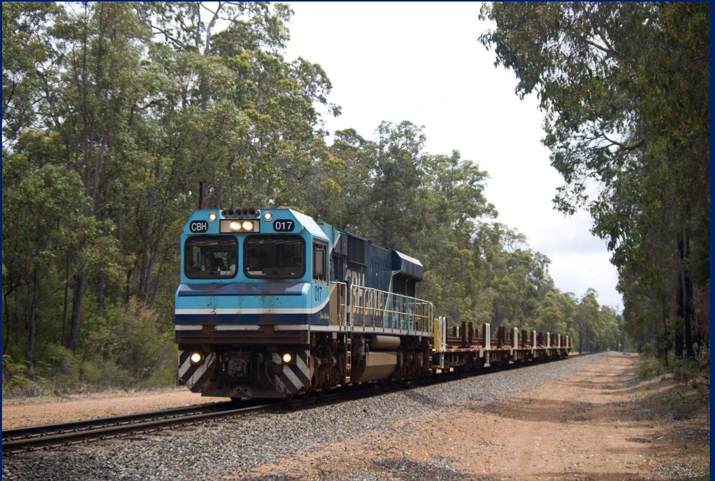
CBH017 on 1RT2 Watco rail train Worsley November 20th.