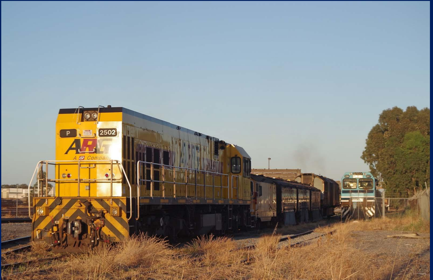
P2502 propels MMY032 rail grinder into flashbutt yard Bellevue November 23rd.