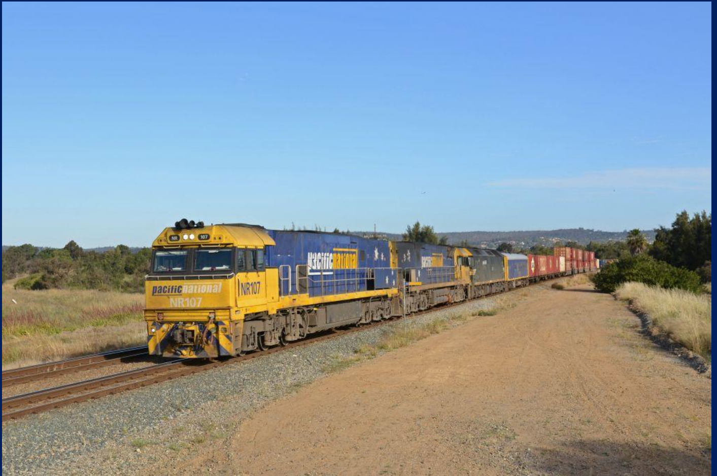
NR107, NR49 & G538 on 3PS6 Perth Sydney intermodal at Stratton 6/11.