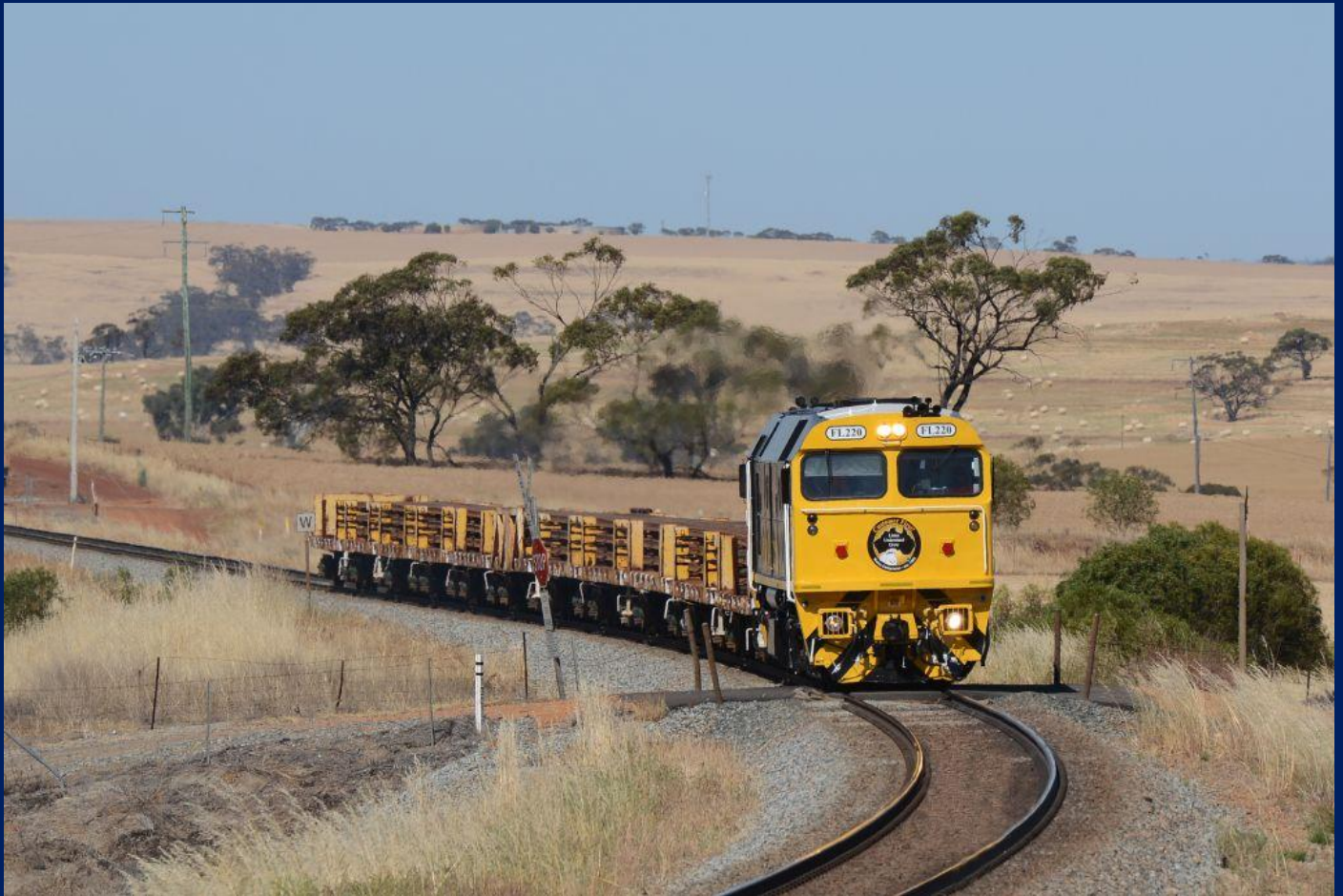
FL220 on 3RT1 Watco rail train Grass Valley November 15th.