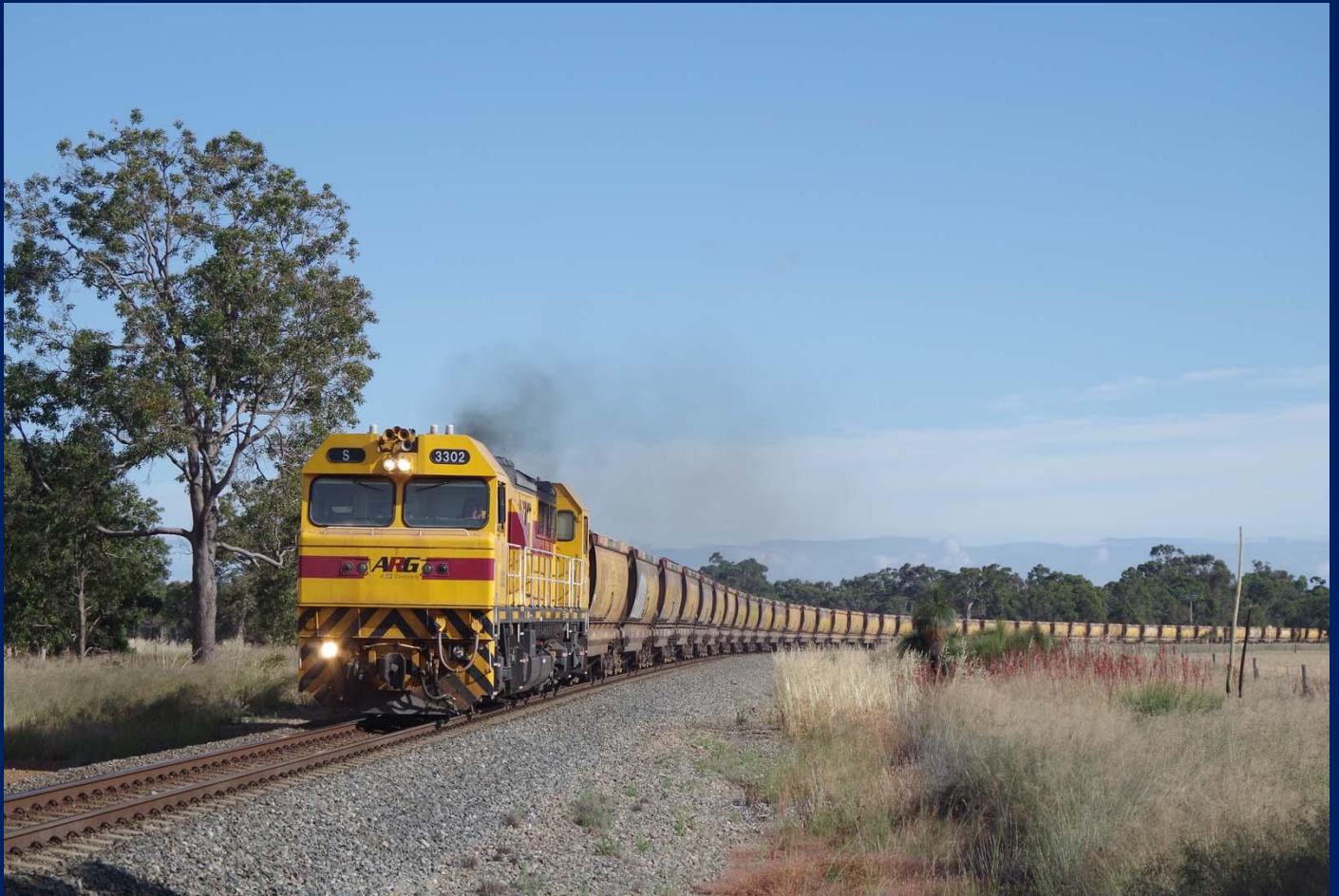
S3302 on 1951 empty bauxite to Calcine at North Dandallup November 20th.