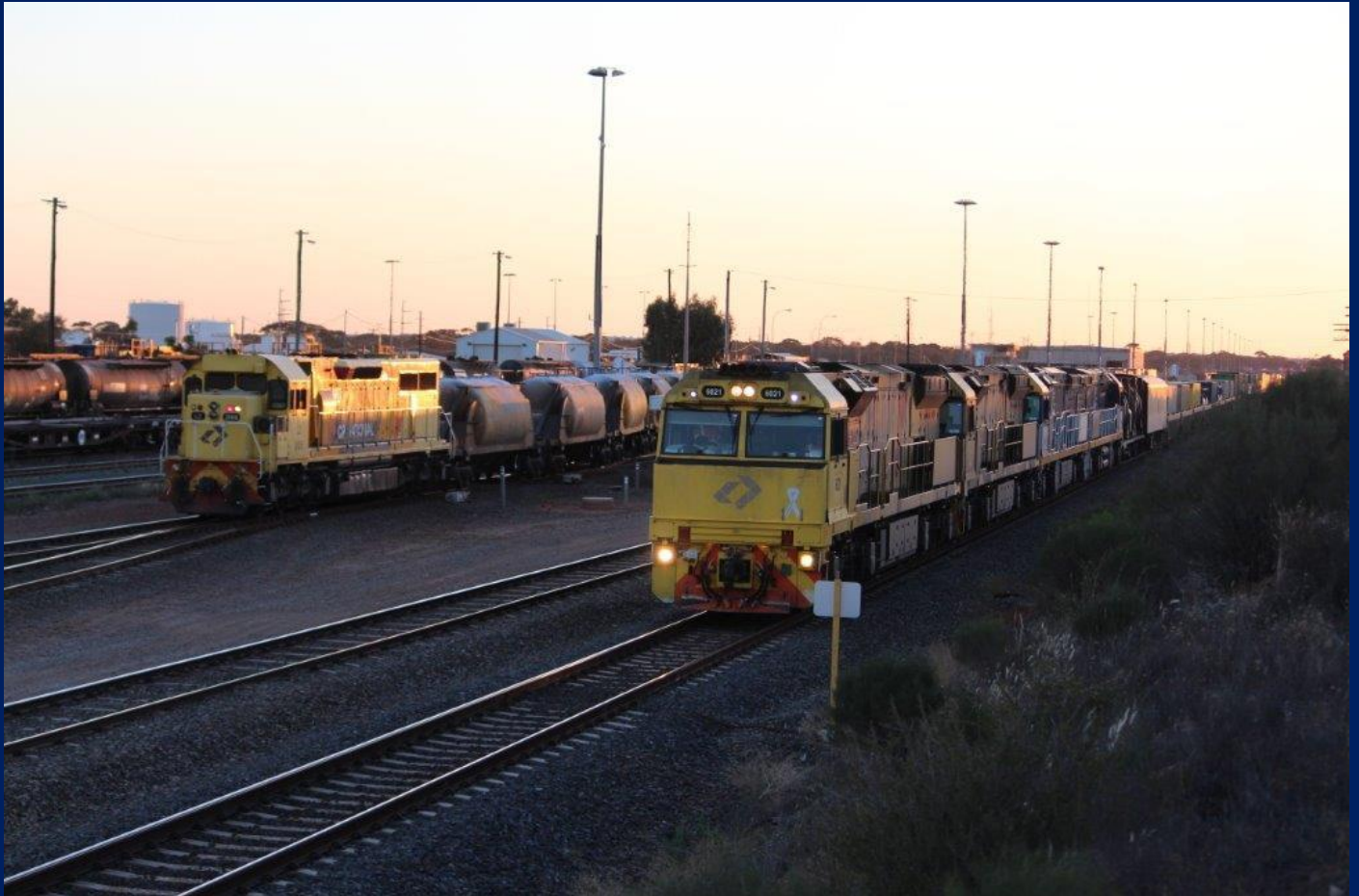
6021, 6029, CF4409, CF4401 on late 7PM1 Aurizon intermodal arriving while LZ3106 yard shunter shunts empty lime wagons onto rear on 7426 freight to Forrestfield at WEK yard 5/11.