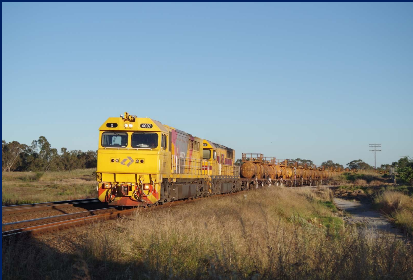
Q4007 & Q4018 on freight Kalgoorlie to Forrestfield at Middle Swan November 6th.