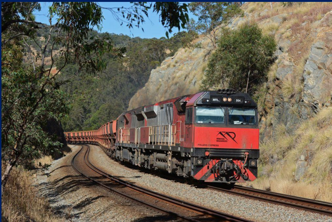
MRLOO4 & MRL006 on 6030 Polaris ore in number one cutting Brigadoon 18/11.