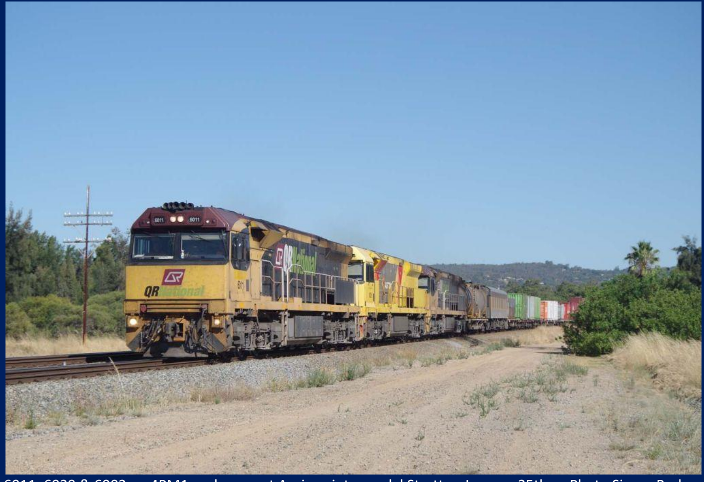
6011, 6029 & 6002 on 4PM1 replacement Aurizon intermodal Stratton January 25th.