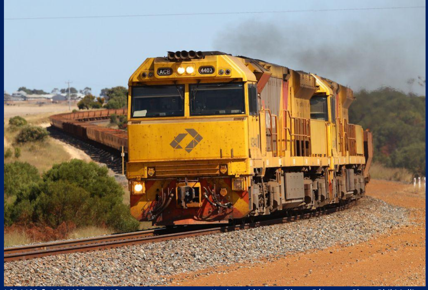
ACB4403 & ACB4406 on 5418 empty Portman ore to Koolyanobbing at Gibson 5/1.