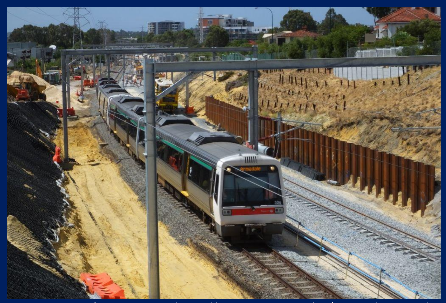
A series EMU sets 06 & 11 running wrong line on old up main at Victoria Park 12/1.