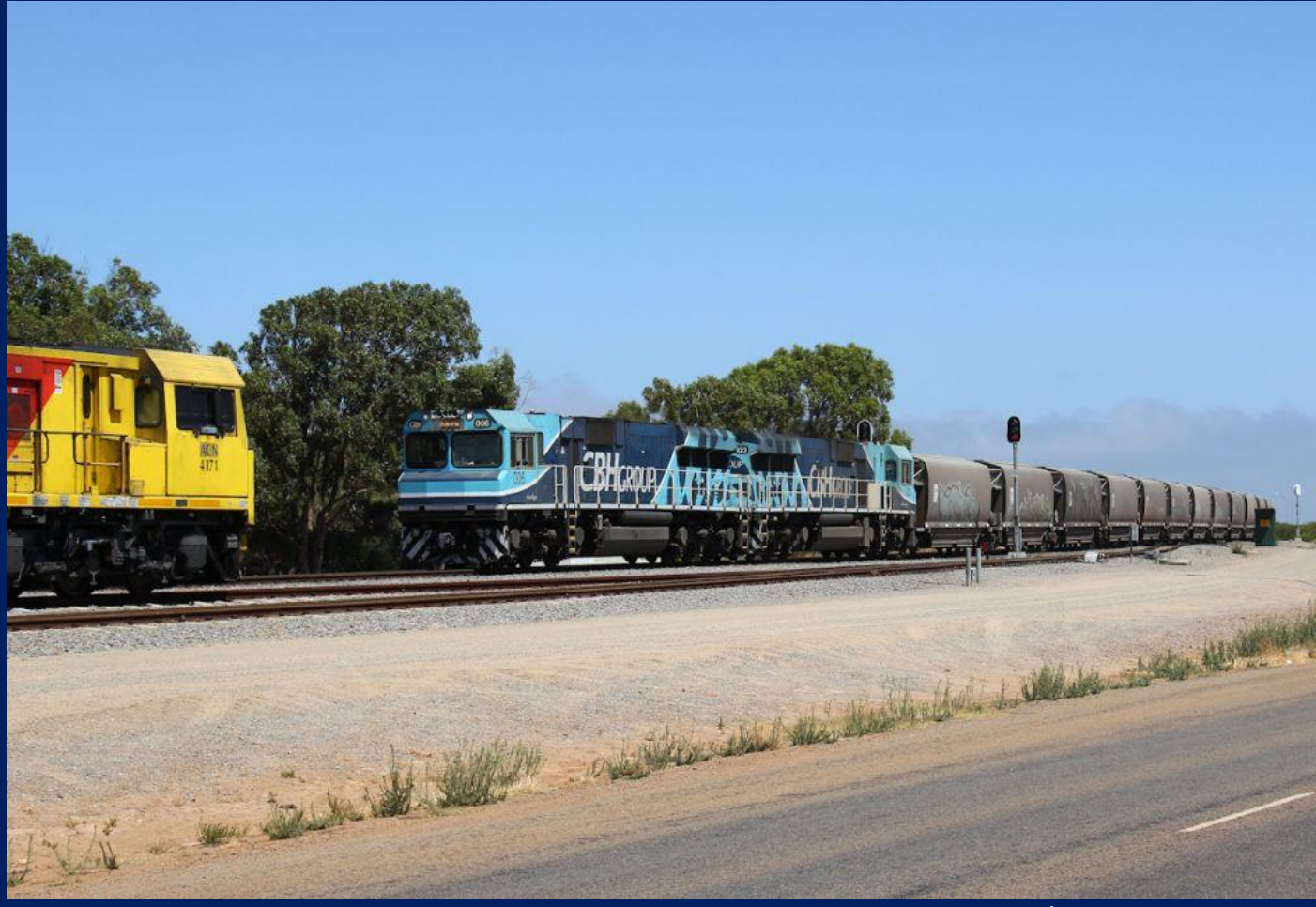
ACN4171 crossing CBH006 & CBH023 on 7G50 empty grain to Carnamah Narngulu 21/1.