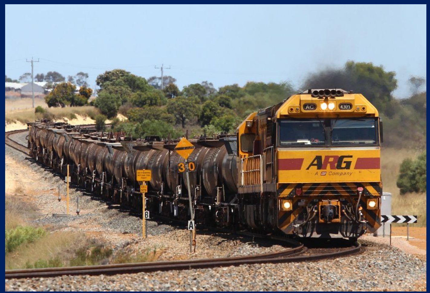
AC4301 & Q4018 on 5442 fuel train Esperance to Kalgoorlie at Gibson January 5th.