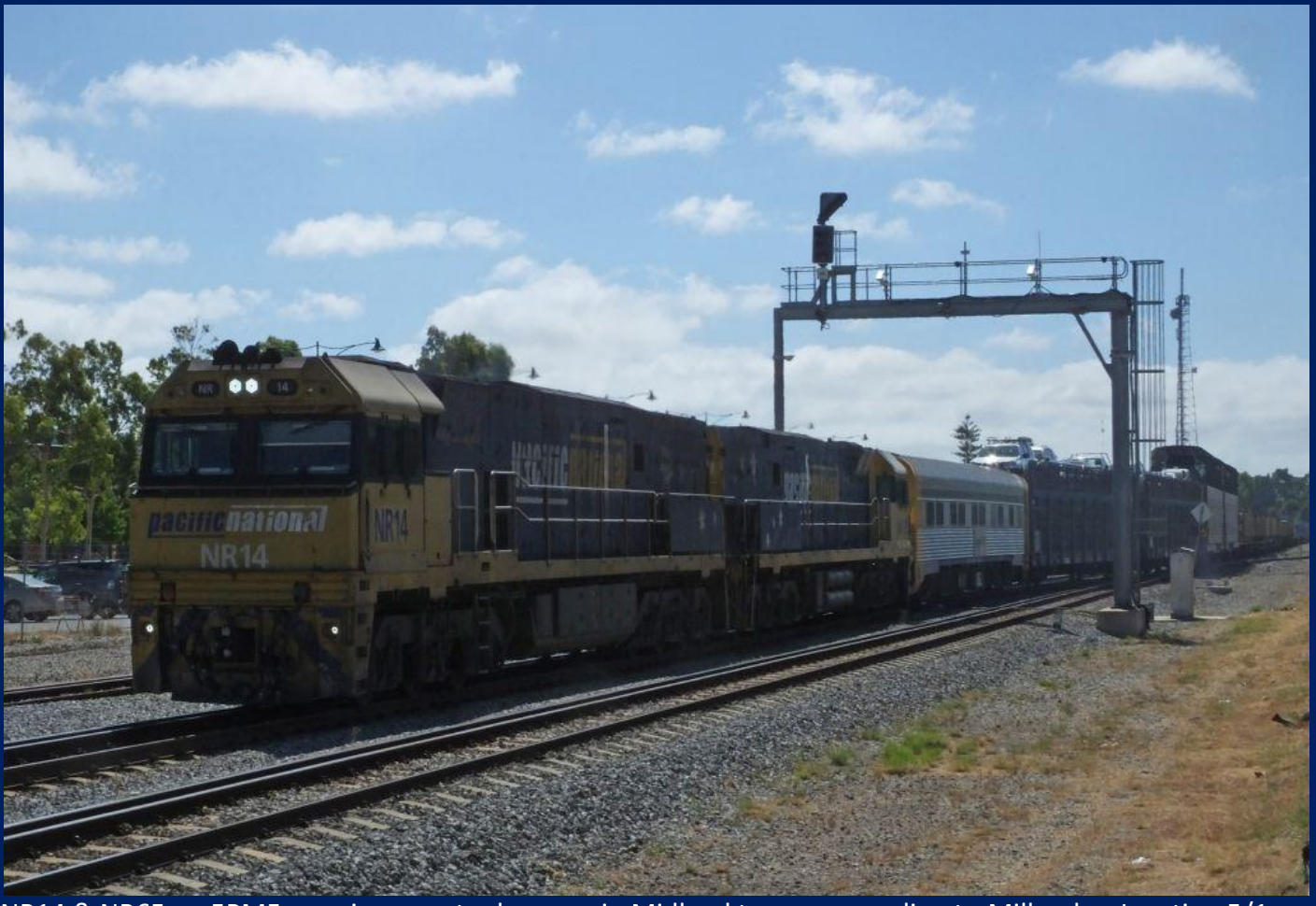
NR14 & NR65 on 5PM5 crossing over to down main Midland to run wrong line to Millendon Junction 5/1.