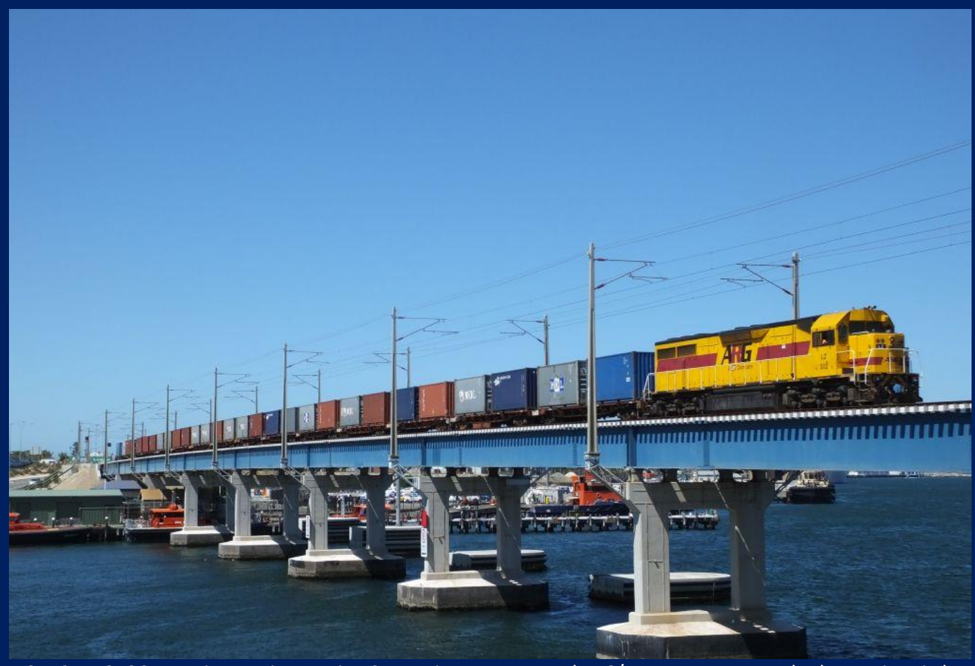
LZ3112 on 2196 container train crossing Swan River at Fremantle 16/1.