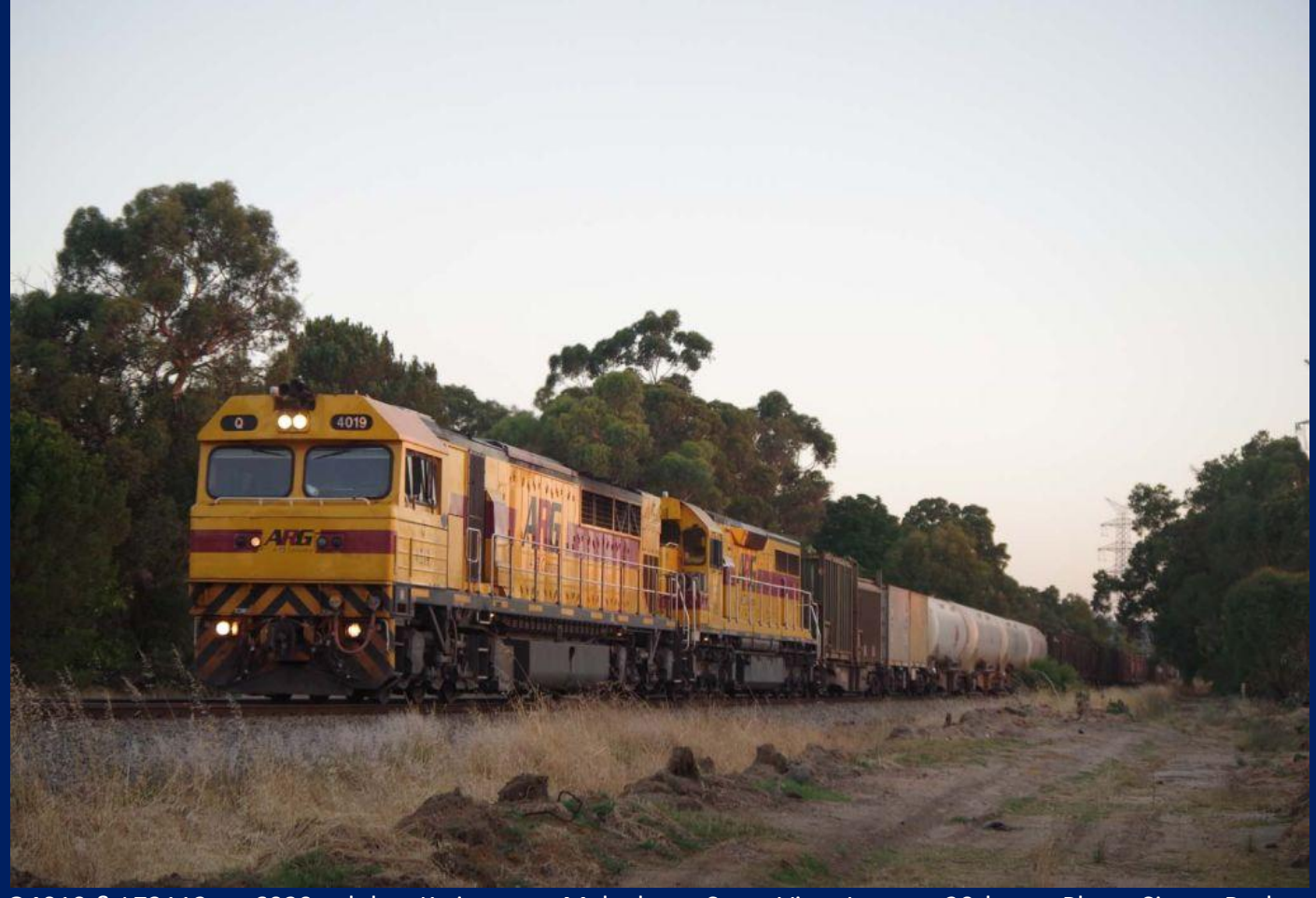
Q4019 & LZ3112 on 6029 sulphur Kwinana to Malcolm at Swan View January 20th.