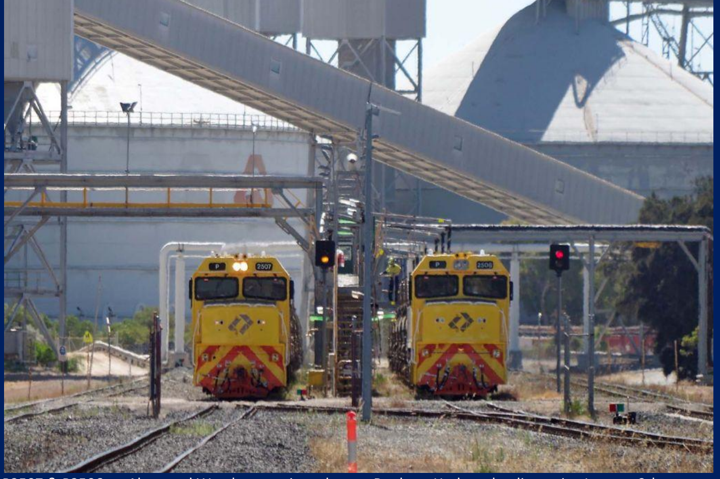
P2507 & P2506 on Alcoa and Worsley caustic tankers at Bunbury Harbour loading point January 9th.