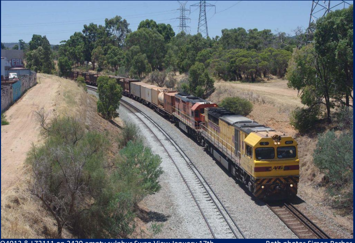
Q4013 & LZ3111 on 2430 empty sulphur Swan View January 17th.