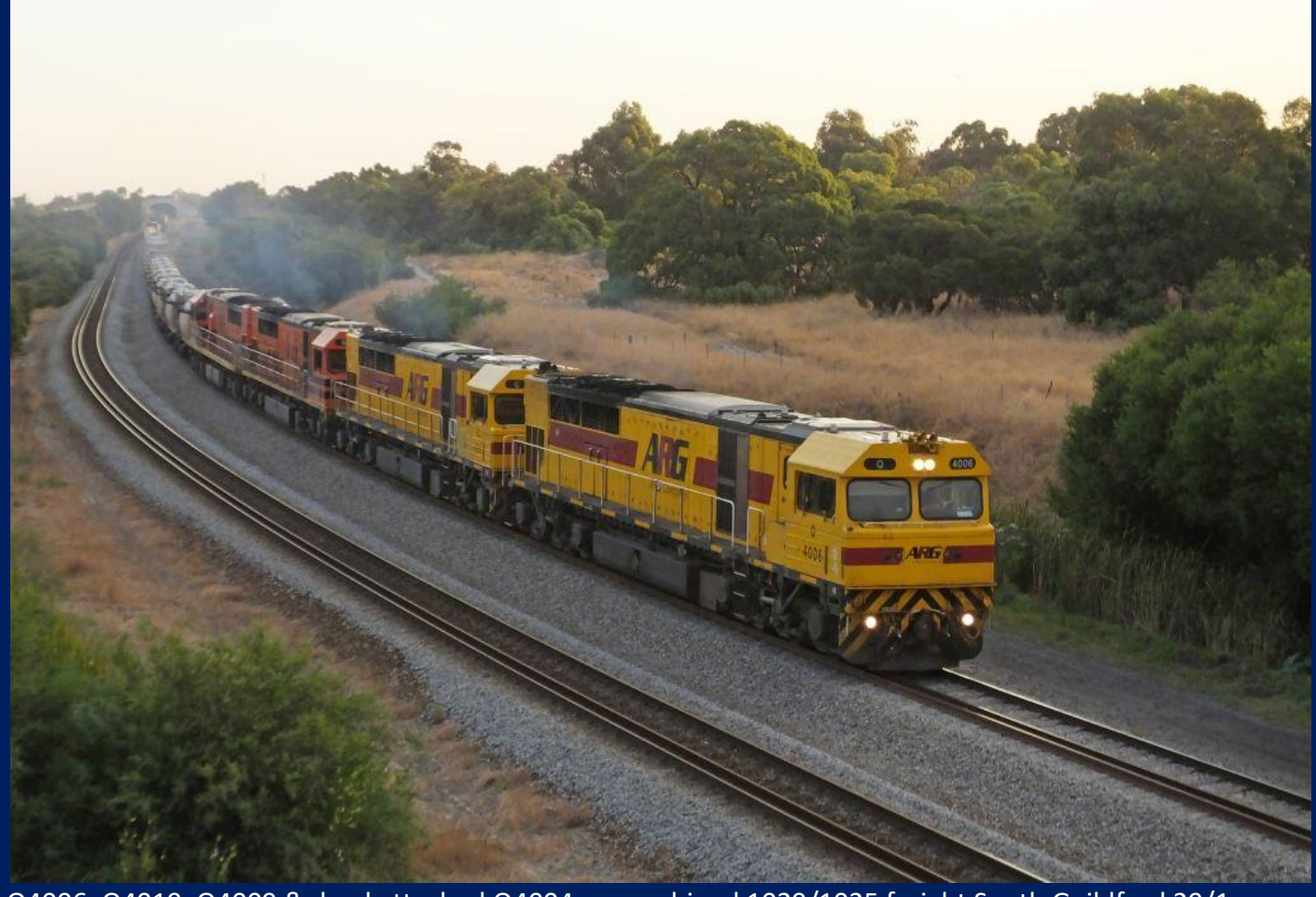
Q4006, Q4019, Q4009 & dead attached Q4004 on combined 1029/1025 freight South Guildford 29/1.