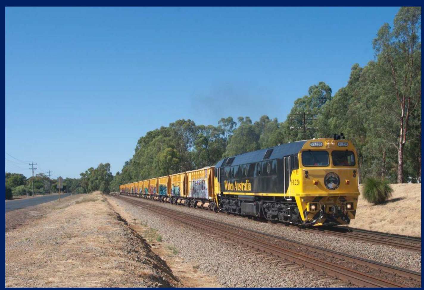
FL220 on 7BT1 ballast train at Middle Swan January 14th.