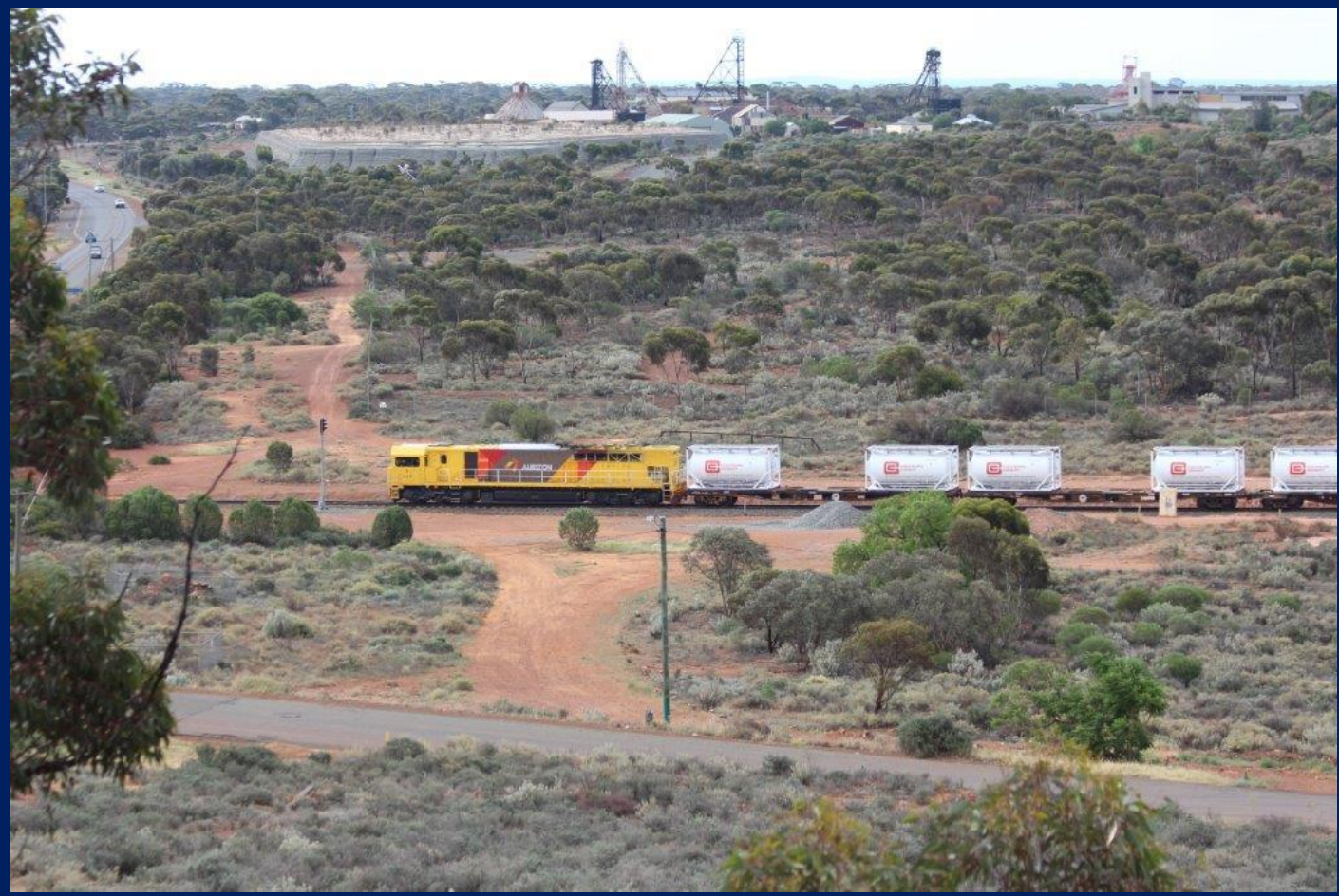
Q4011 on 3C74 with Hannans North Tourist mine and Mining Hall of Fame in background is about to enter Brookfield territory and pass under Goldfields Highway at Kalgoorlie 17/1.