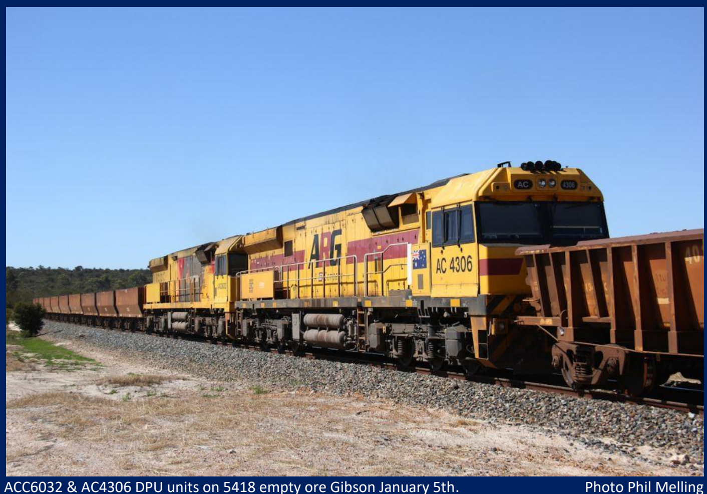
ACC6032 & AC4306 DPU units on 5418 empty ore Gibson January 5th.