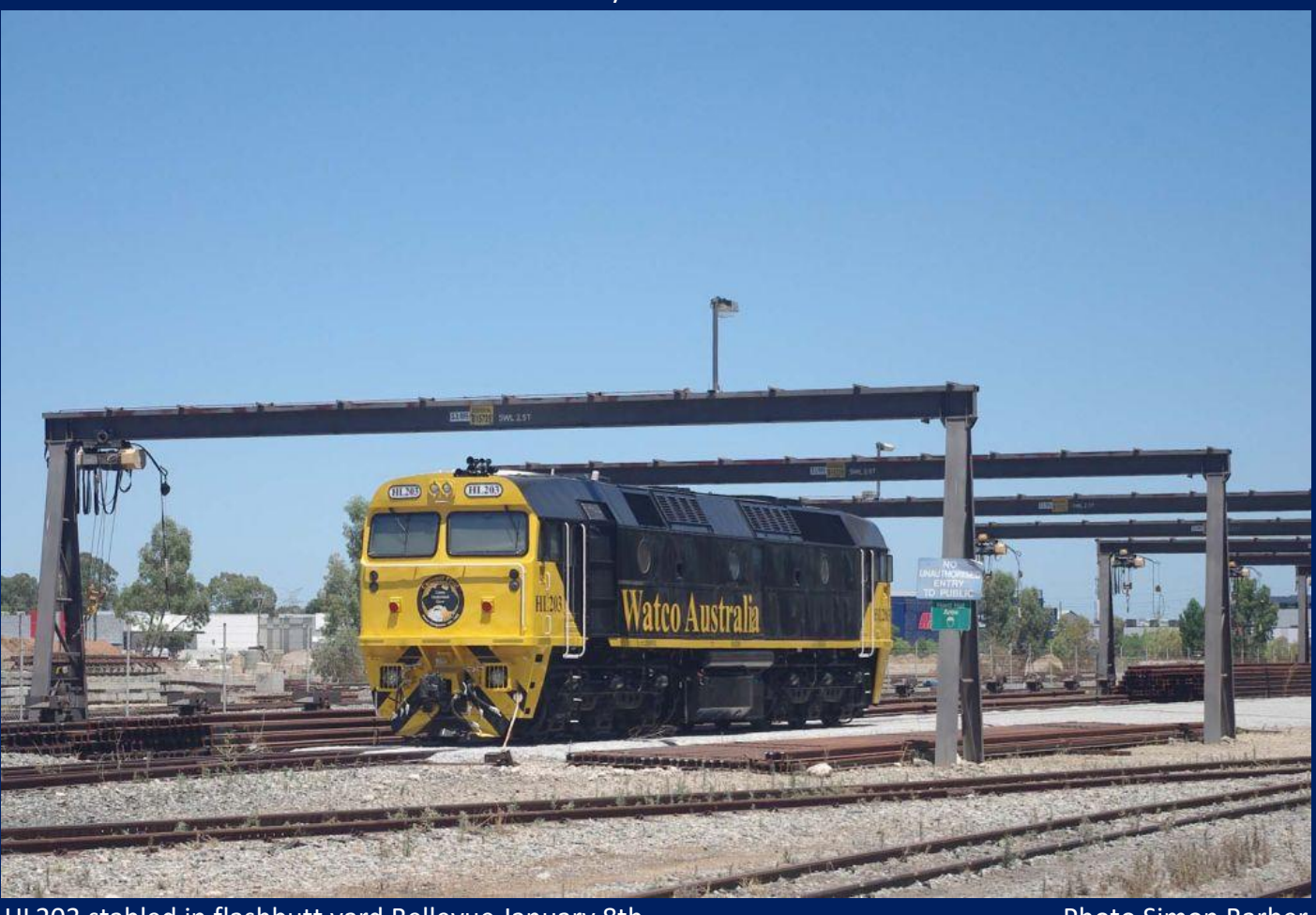
HL203 stabled in flashbutt yard Bellevue January 8th.