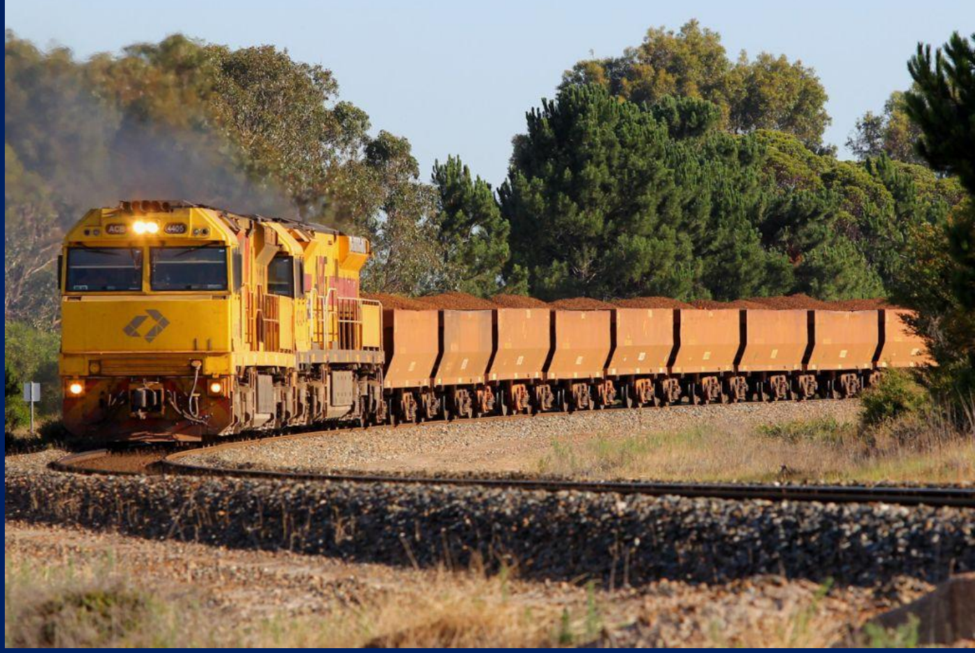
ACB4405 & AC4304 on 3417 Portman ore ex Koolyanobbing to Esperance Myrup 4/1.