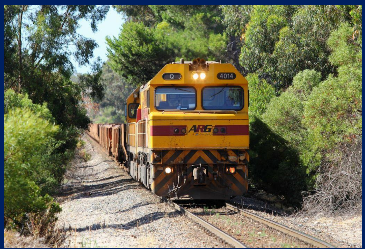
Q4014 & Q4015 on empty shuttle from port approaching Esperance Yard January 4th.