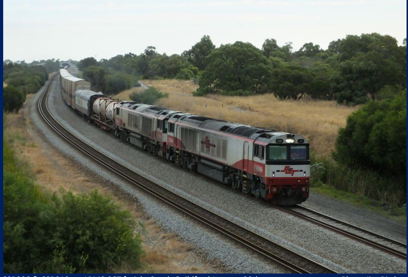
CSR006 & CSR010 on 1PM9 SCT freight South Guildford January 29th.