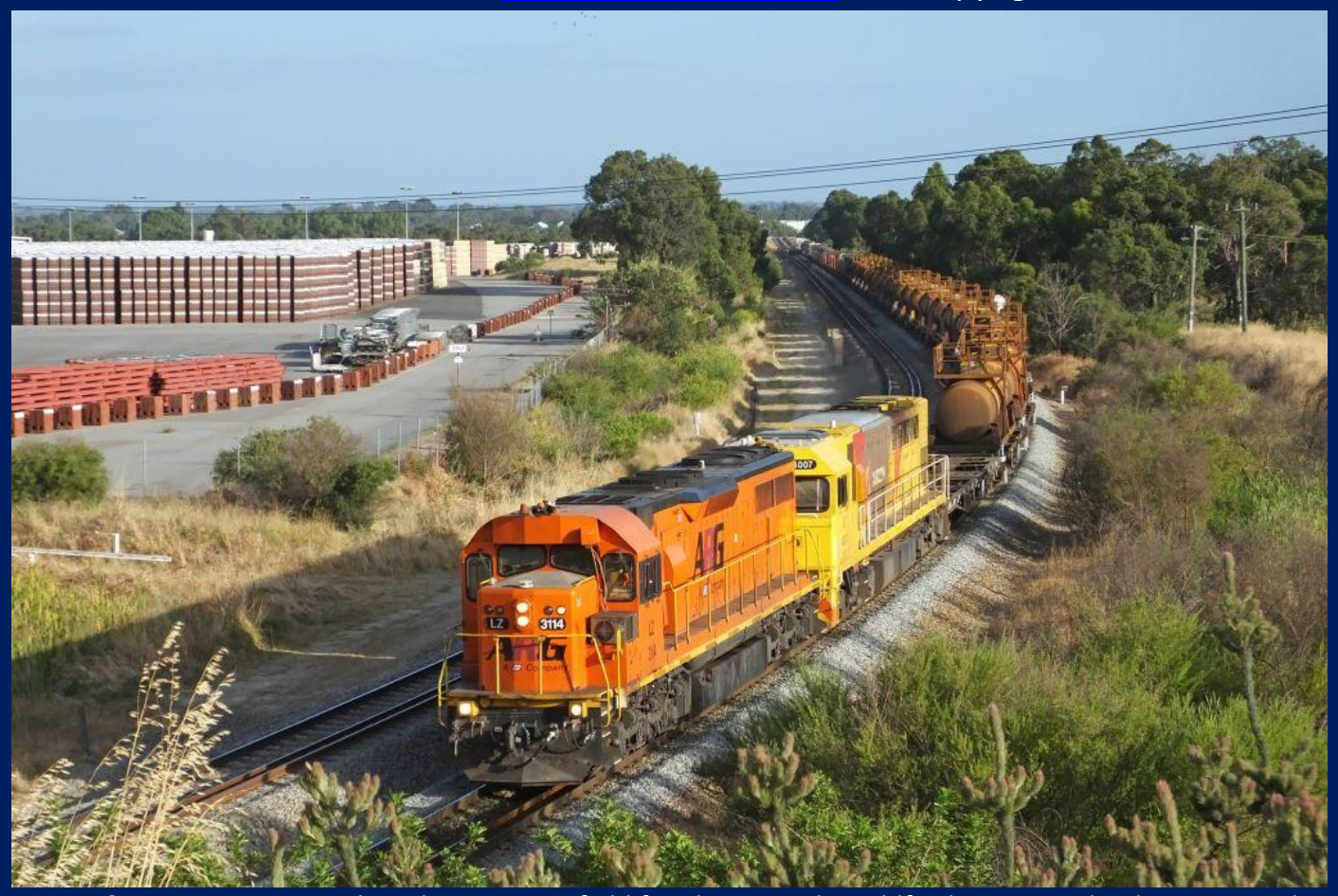
LZ3114 & Q4007 on 5426 Kalgoorlie to Forrestfield freight at South Guildford January 6th.