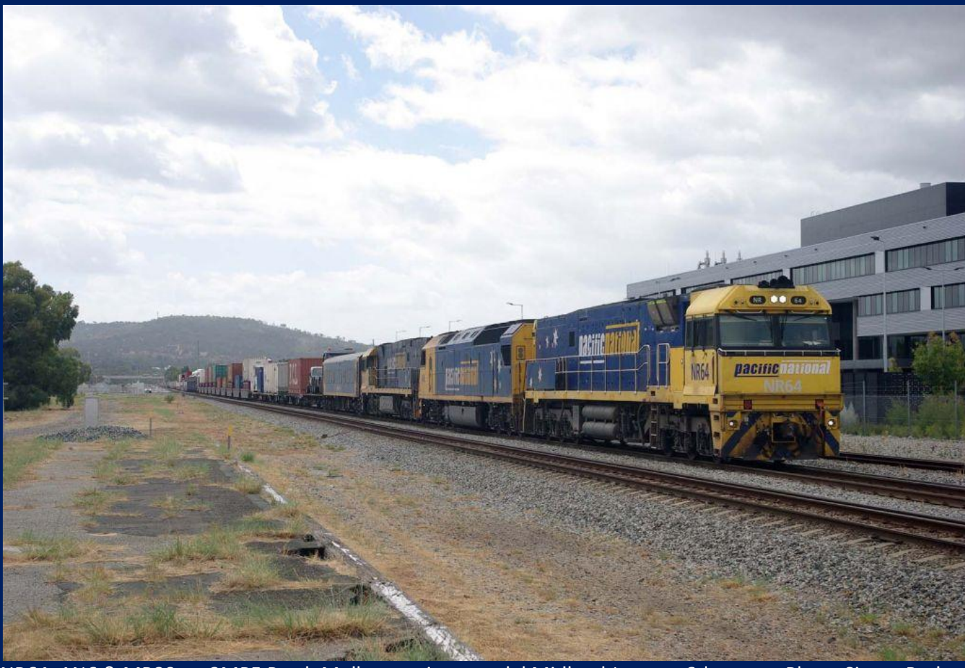
NR64, AN6 & MR29 on 3MP5 Perth Melbourne intermodal Midland January 6th.