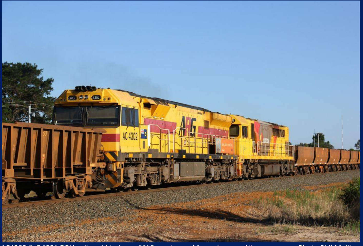
AC4302 & Q4001 DPU units mid train on 4416 empty ore Myrup January 4th.