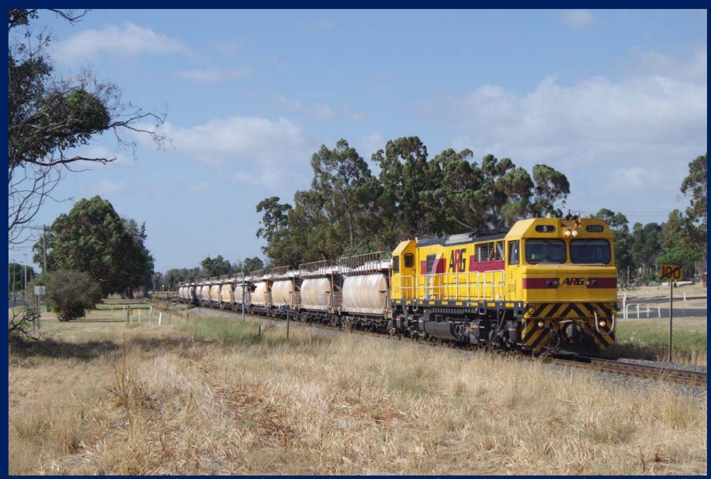
S3309 on 5271 lime Soundcem to Hamilton at Yarloop January 12th.