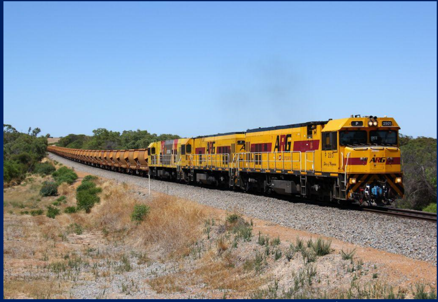
P2501, P2502 & P2517 the first and last of P class on 1720 empty ore at Bringo 01/01.