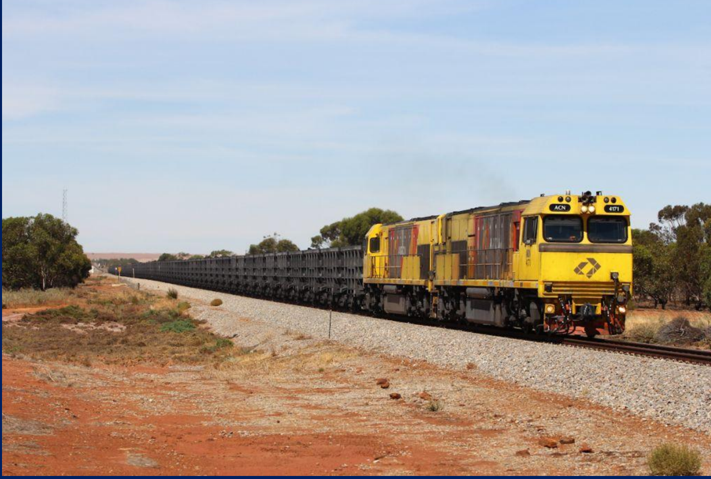
ACN4171 & ACN4144 with DPU 4169 on 6763 Karara ore at Tenindewa January 20th.