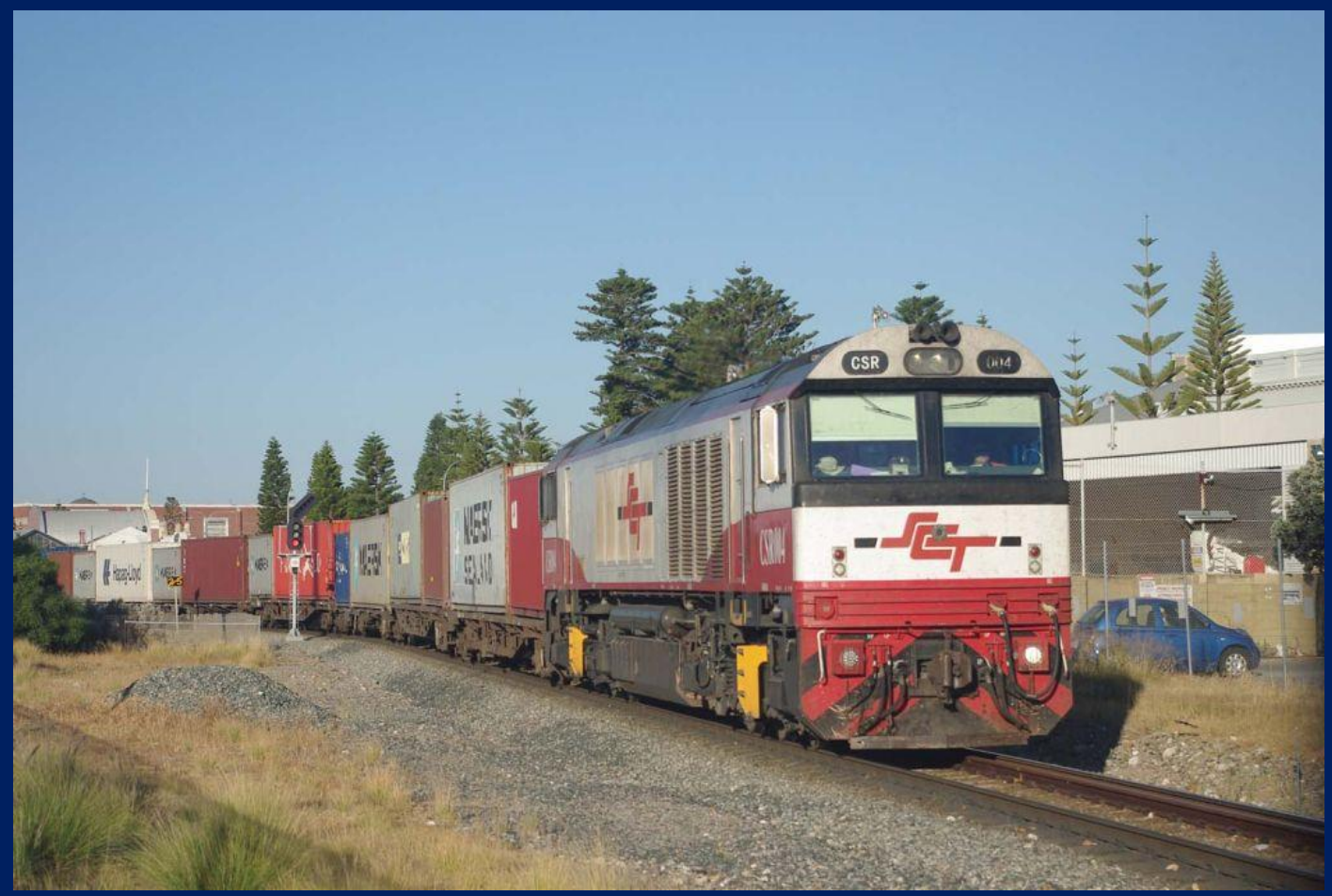
CSR004 on 6143 ILS port shuttle passing thru Fremantle January 27th.