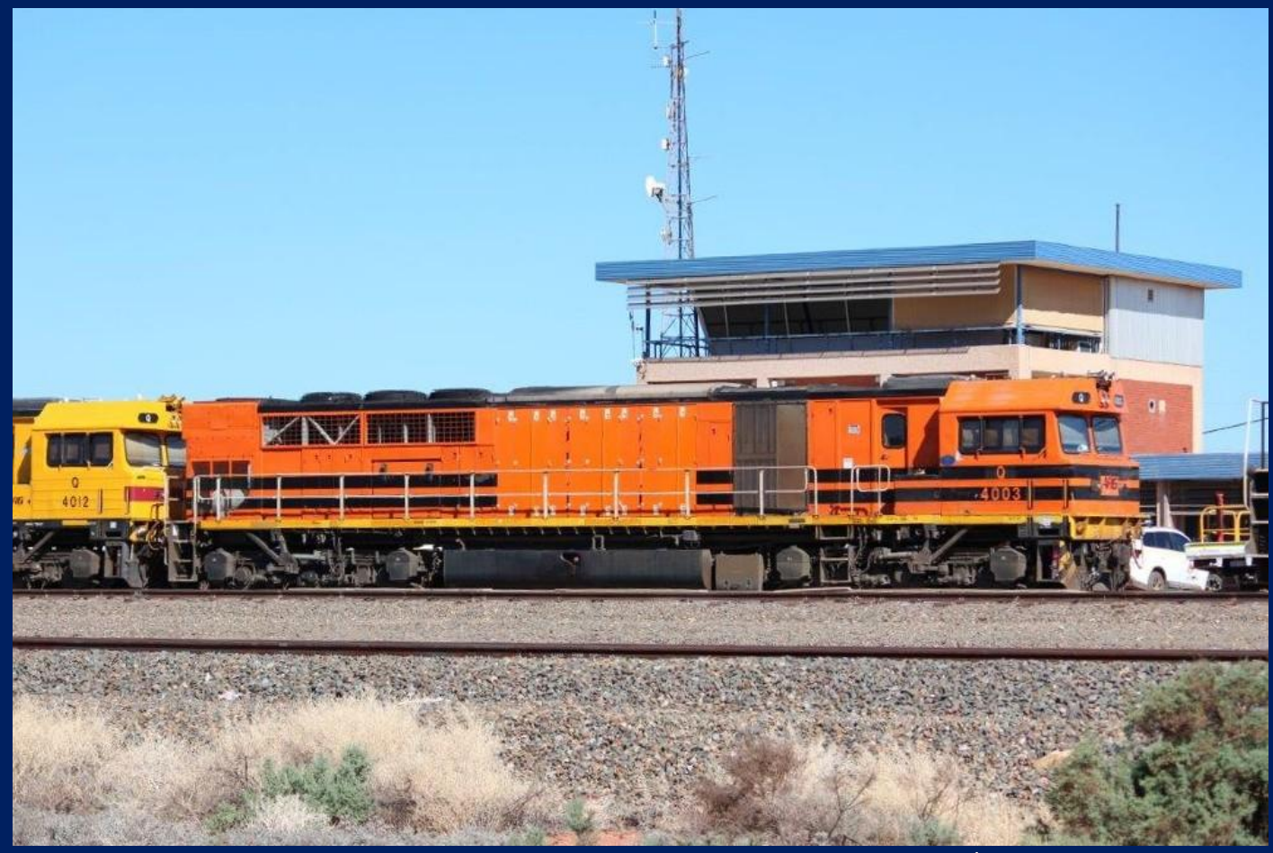
Q4003 at WEK now with long hood side panels repainted to remove ARG name 13/1.