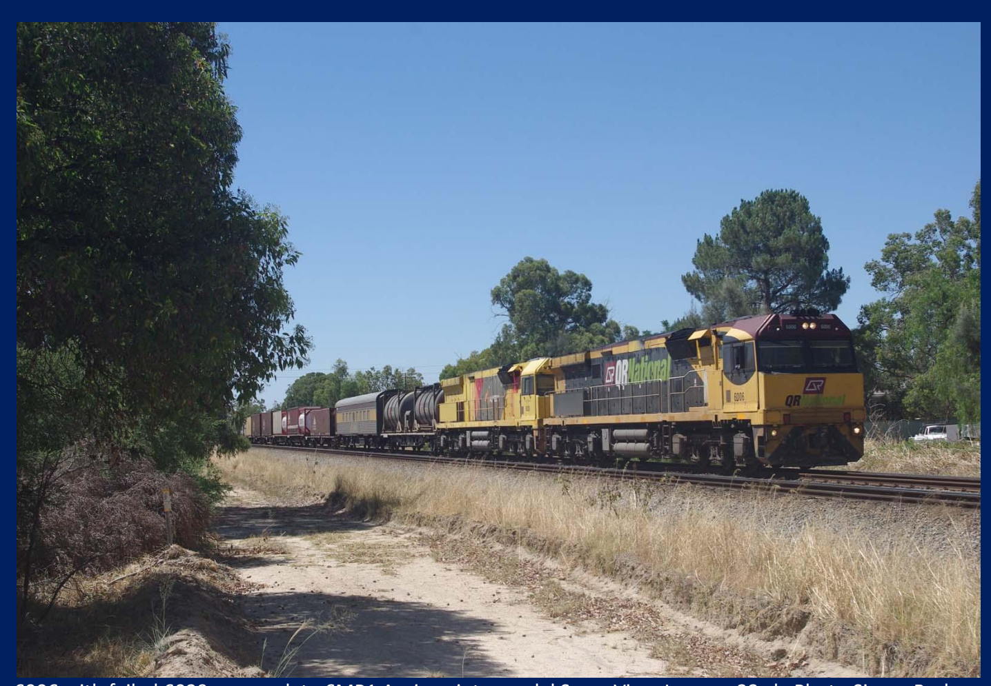
6006 with failed 6029 on very late 6MP1 Aurizon intermodal Swan View January 23rd.