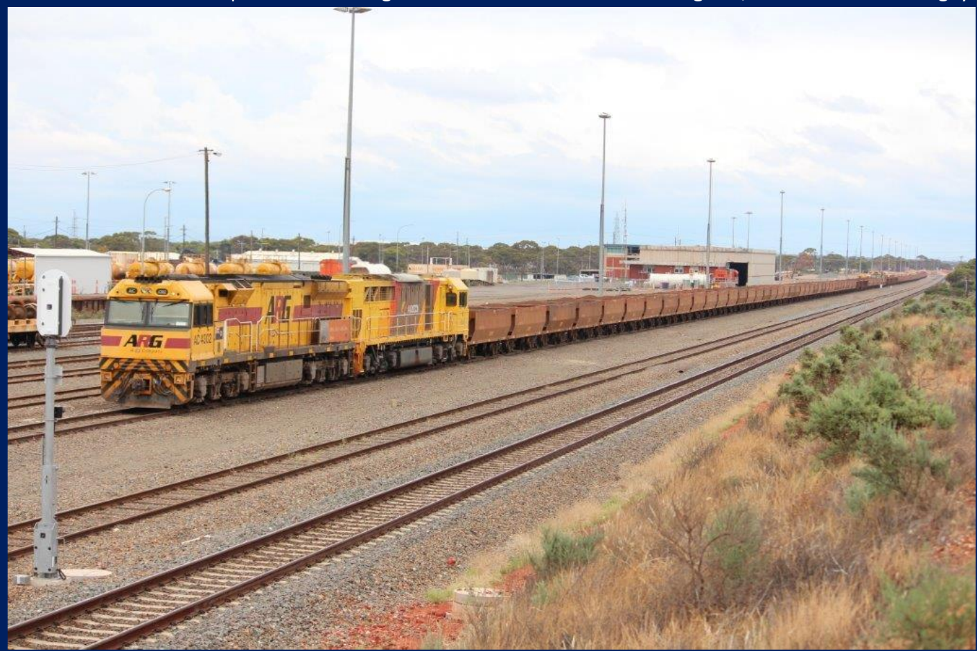
AC4302 & Q4002 on recovered 6415 ore hauled back to arrival road WEK yards 29/1 following Hampton derailment 27/1 [7xore cars remained upright] but did damage track.