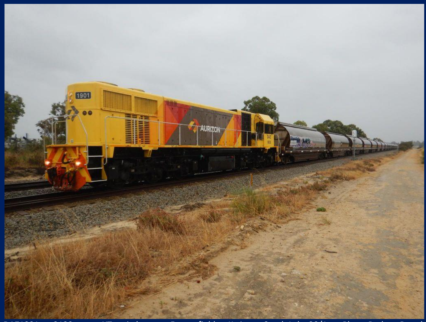
DAZ1901 on 2120 empty XT grain hoppers Forrestfield to Kwinana South Lake 30/1.