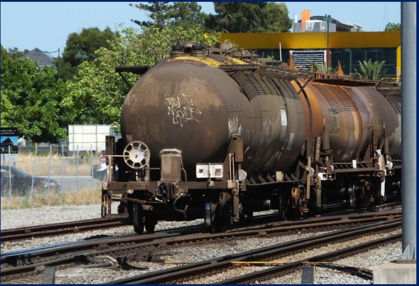
Broken coupler on tanker CX521 on rear 3426 freight at Midland January 24th.