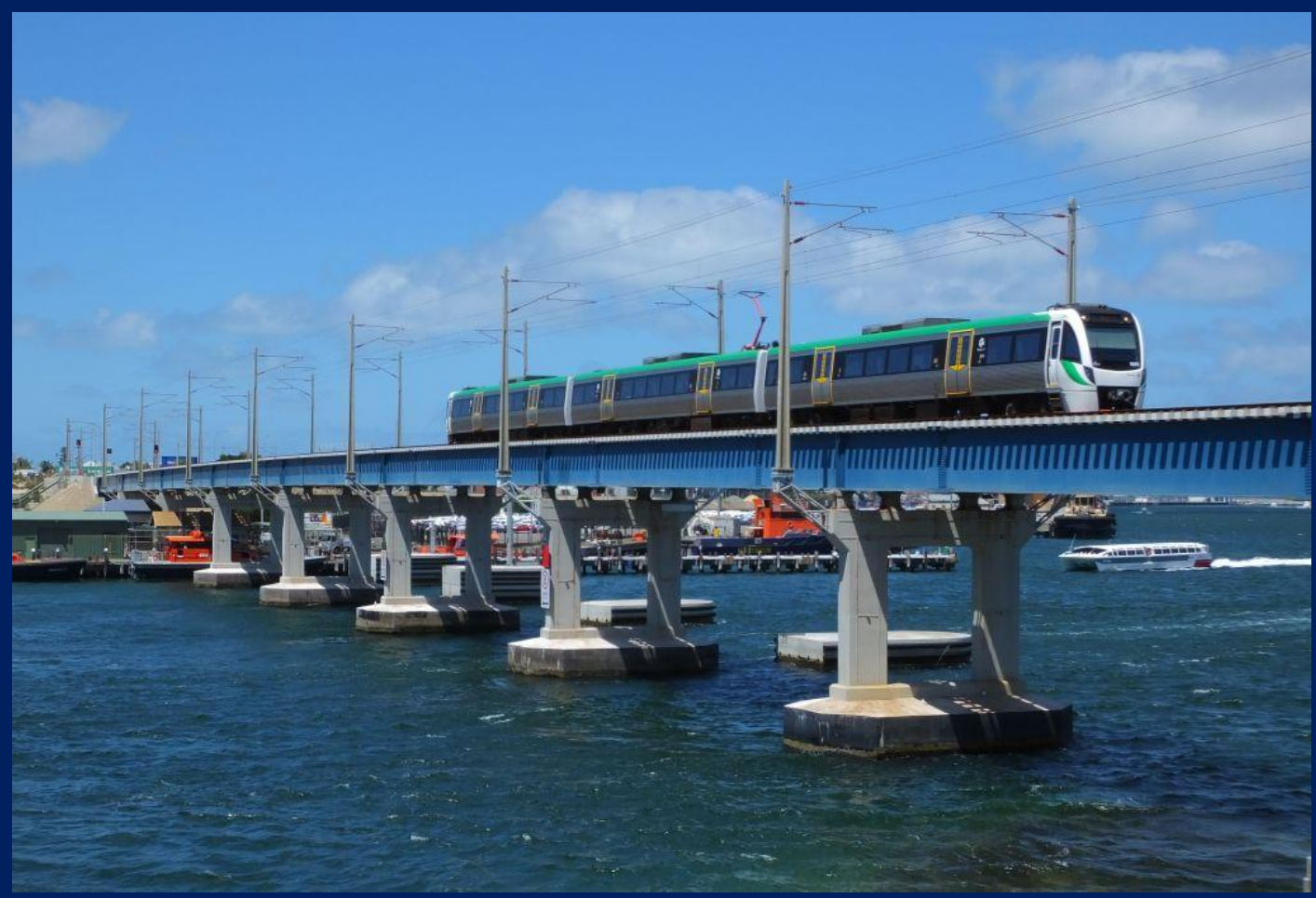
B series EMU set 098 crossing Swan River at Fremantle during weekend shutdown 22/1.