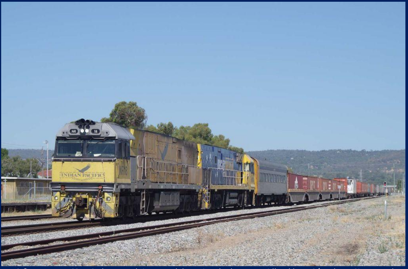
NR18 & NR114 on 6SP5 Sydney Perth intermodal passing dual gauge Midland loop 8/1.