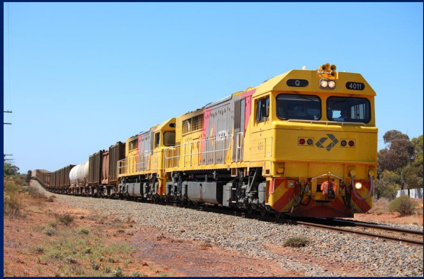
Q4011 & Q4007 on 6029 sulphur to Malcolm on undulating Leonora line north of Kalgoorlie 14/1.