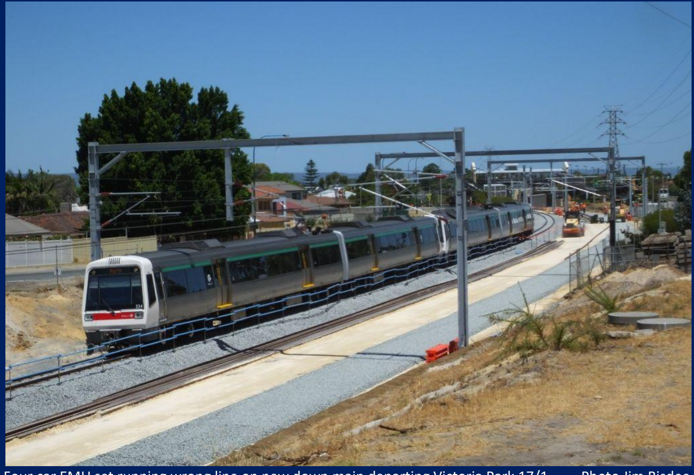
Four car EMU set running wrong line on new down main departing Victoria Park 17/1.