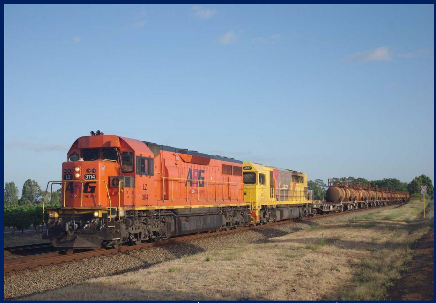
LZ3114 & Q4007 on 5426 Kalgoorlie Forrestfield/Kwinana freight at Middle Swan 6/1.