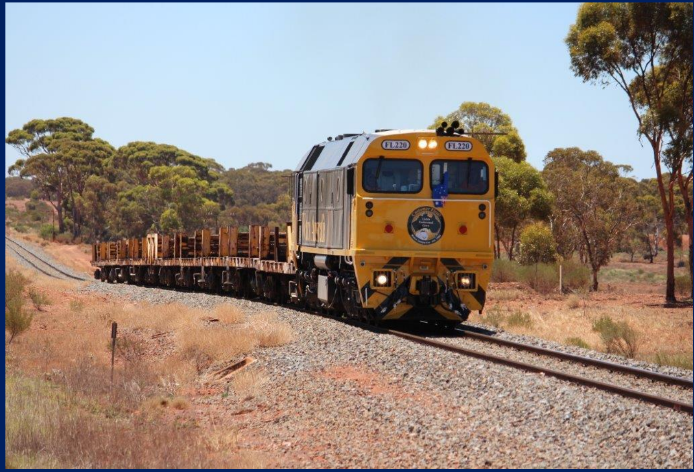
Watco FL220 on 5RT1 empty rail train from Leonora nearing Kalgoorlie 26/1.