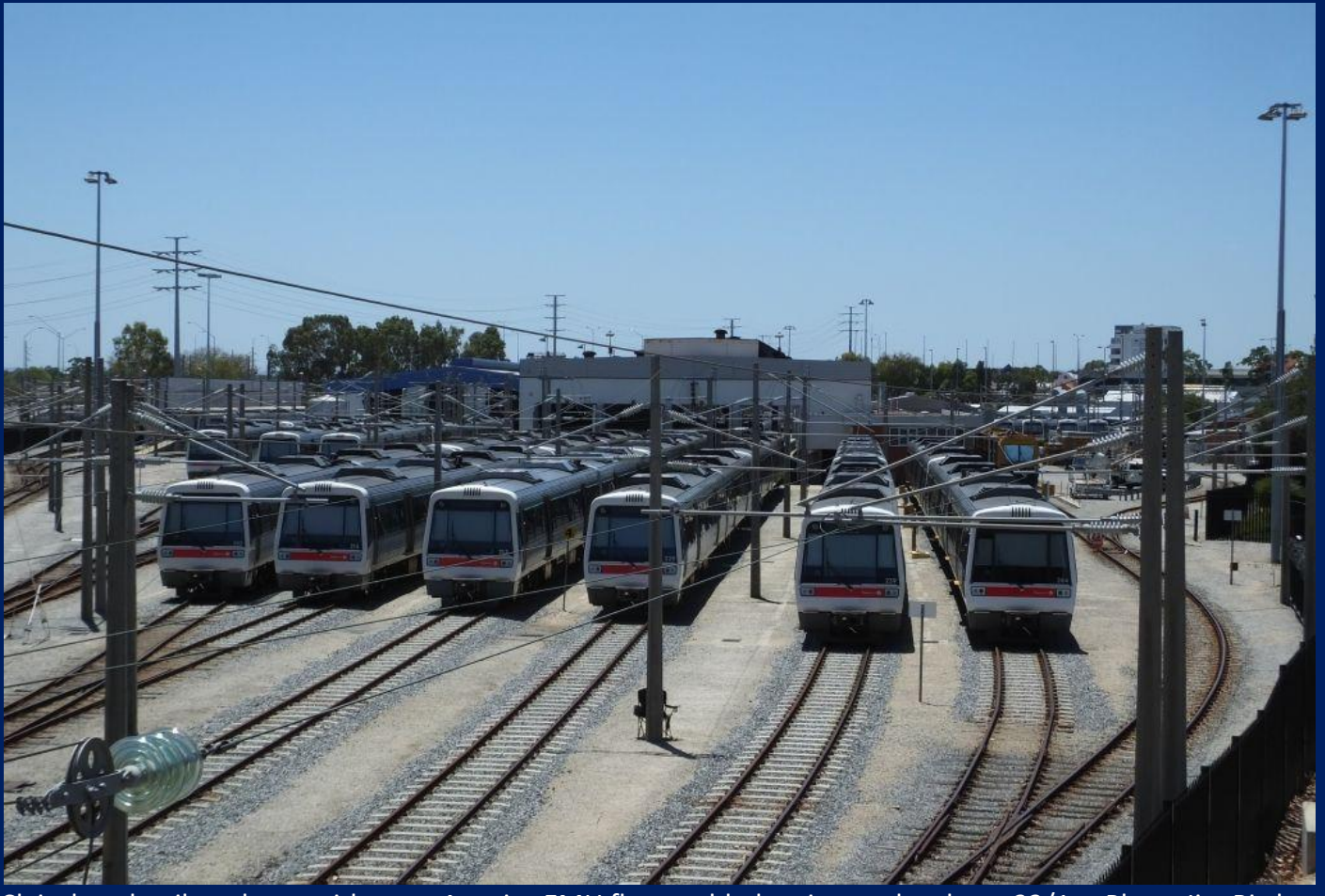
Claisebrook railcar depot with most A series EMU fleet stabled owing to shutdown 22/1.