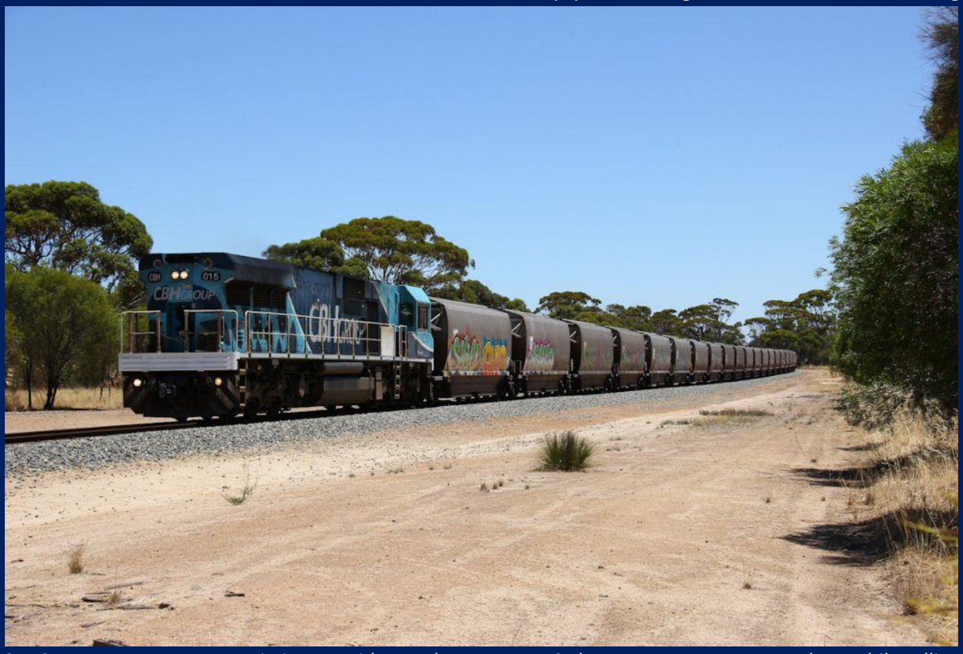
CBH015 on empty Watco grain just outside Brookton January 3rd.