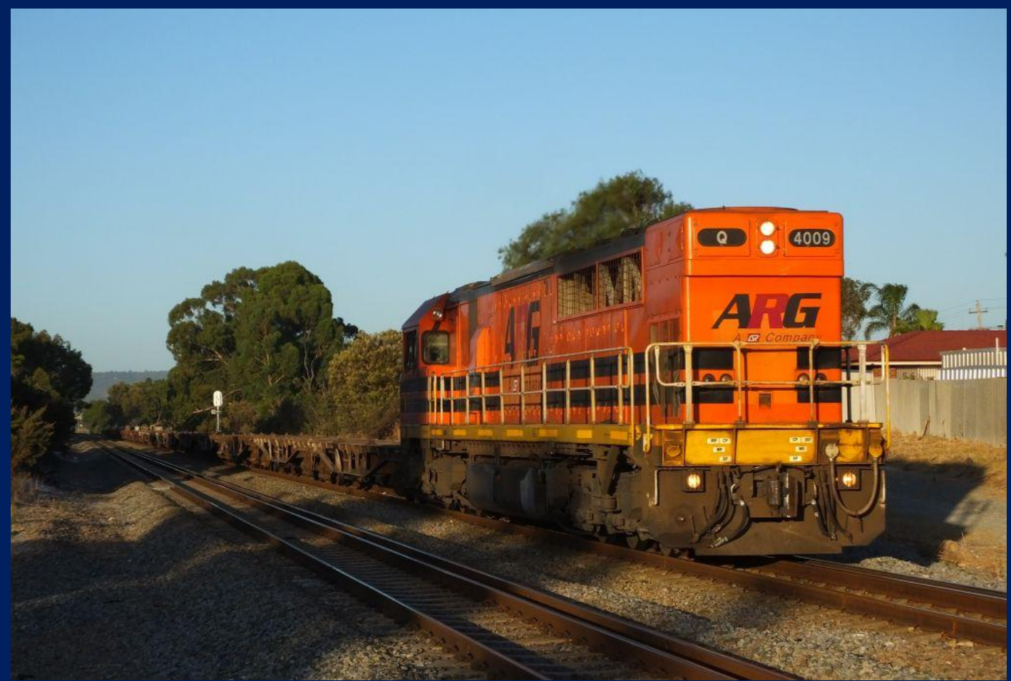
Q4009 on 2170 empty container wagons Forrestfield to Kwinana at Thornlie 23/1.