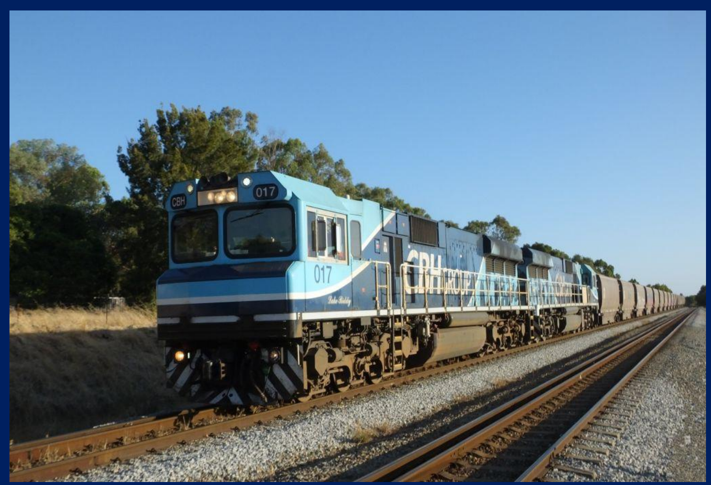
CBH017 & CBH025 on 7K03 empty Watco grain running wrong line Hazelmere 07/01.