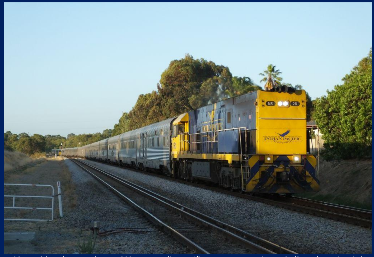
NR28 not able to be turned runs 7003 empty Indian Pacific cars to PFT Hazelmere 07/01.