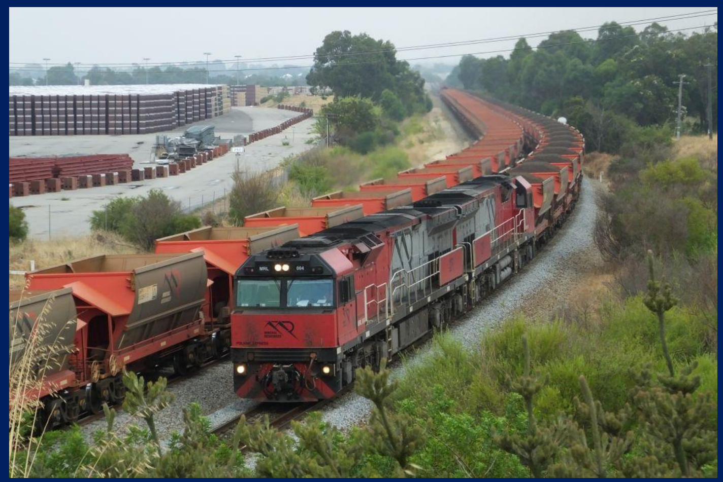
MRL004 & MRL005 on 1030 ore crossing 1035 empty ore South Guildford 29/1.