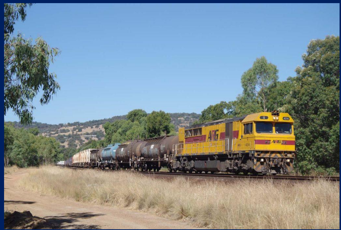
Q4014 on 3428 [second division of 2426 freight] rescue at Millendon Junction 24/1.