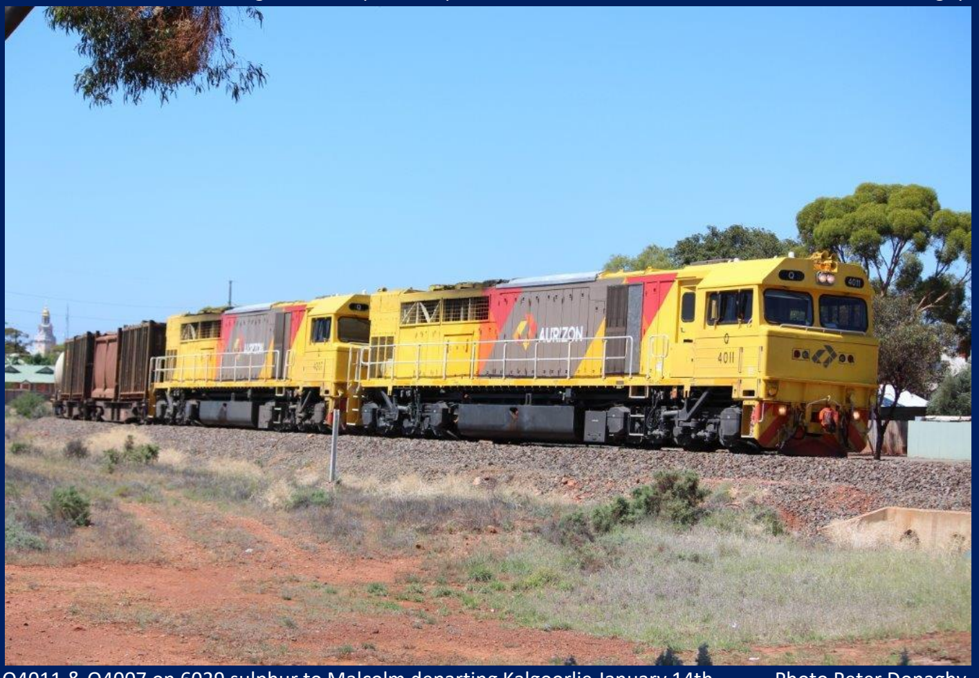
Q4011 & Q4007 on 6029 sulphur to Malcolm departing Kalgoorlie January 14th.