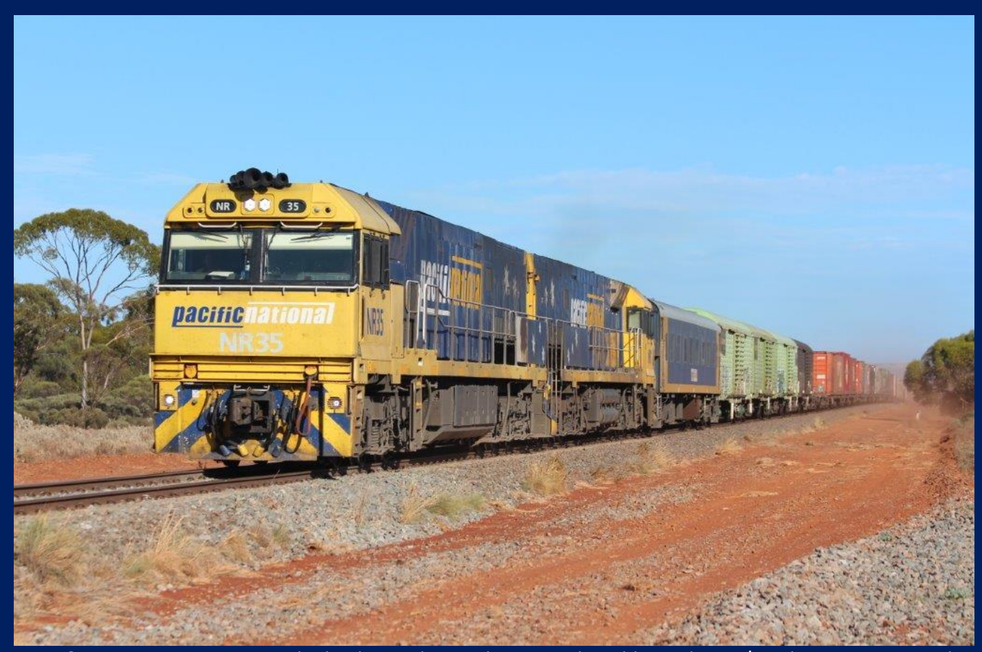
NR35 & NR11 on 6PS7 express climbs the grade 1761km towards Golden Ridge 28/1.