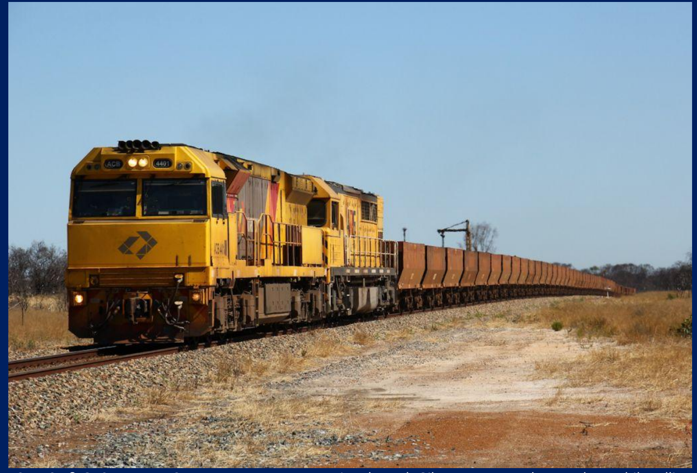
ACB4401 & Q4017 on 4416 empty Portman ore passing through Gibson January 4th.