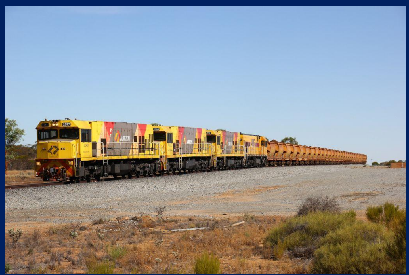
P2517, P2504, 2512 & 2514 on 6721 Mt Gibson Perenjori ore Tardun January 20th.