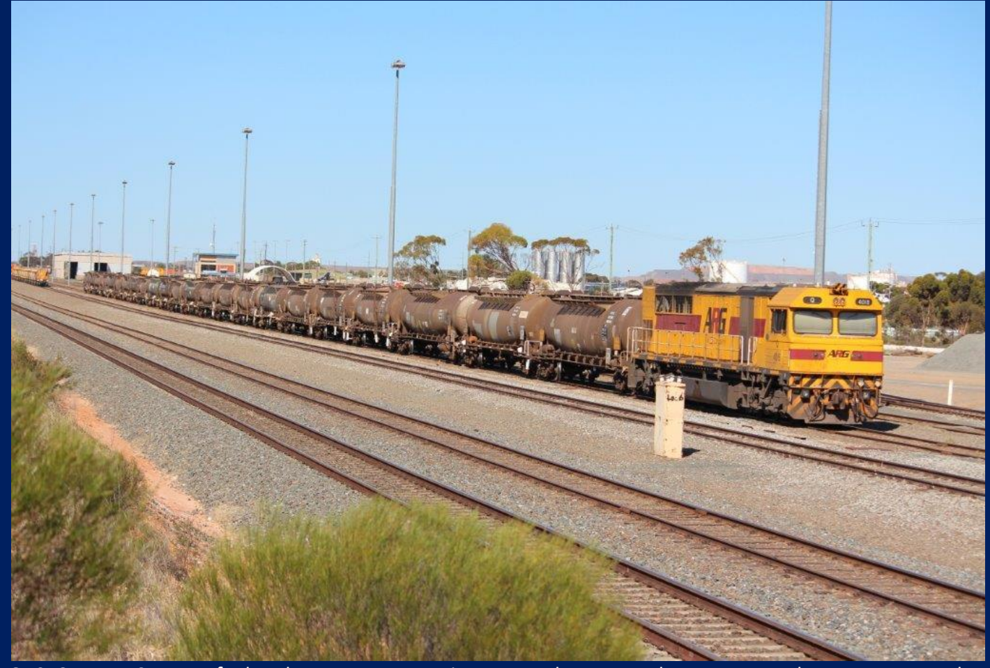
Q4018 on 4443 empty fuel tankers to Esperance in WEK yard January 4th.