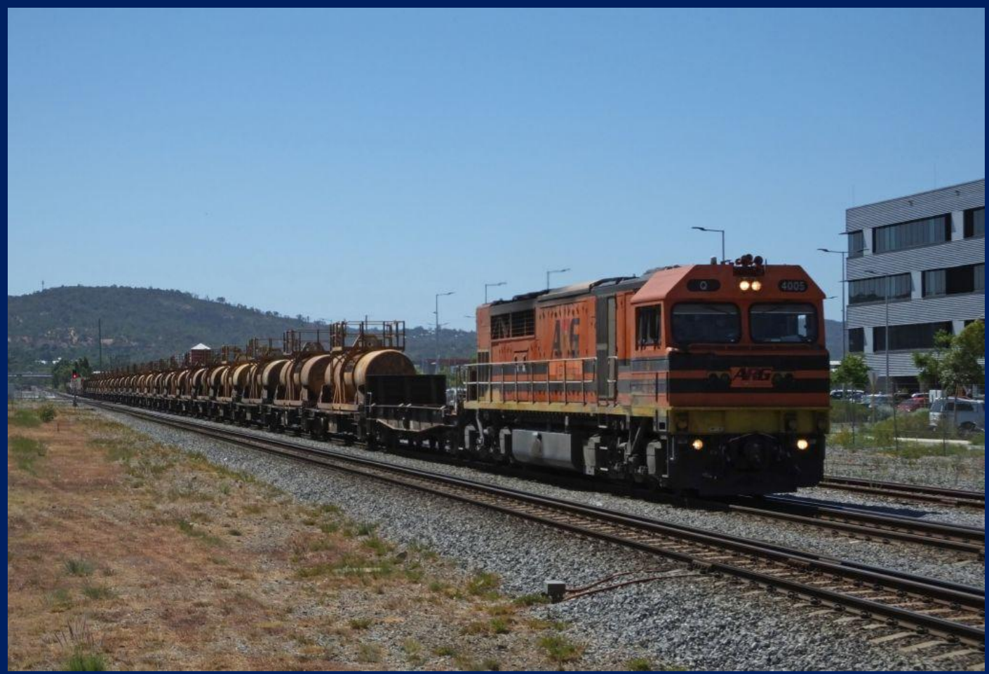
Q4005 on first division 3426 that had coupler failure in Avon Valley at Midland 24/1.