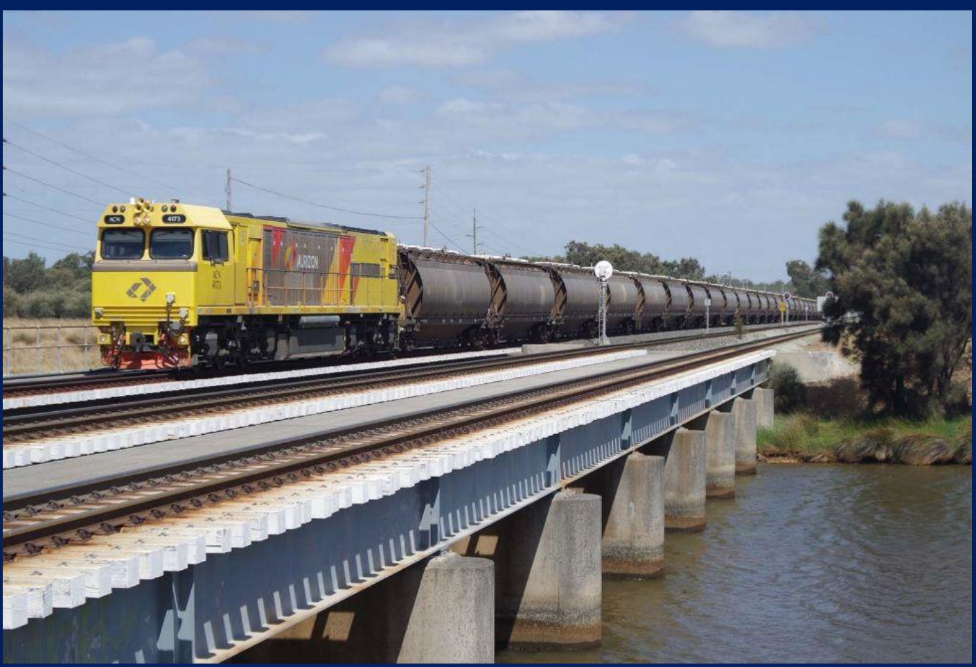
ACN4173 on 5873 alumina crossing Preston River about to enter port unloader 12/01.