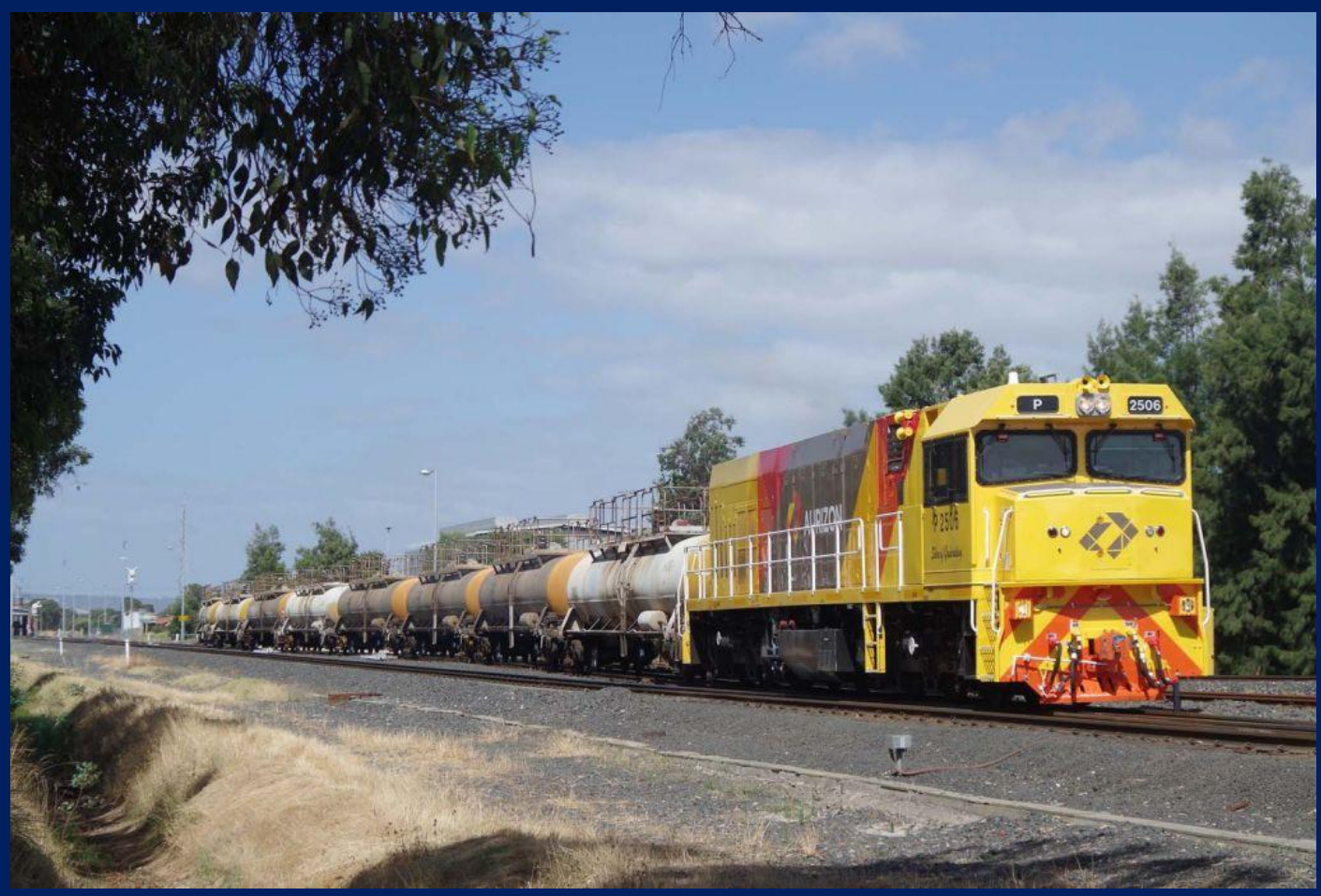
P2506 on 5921 caustic departing Picton January 12th.