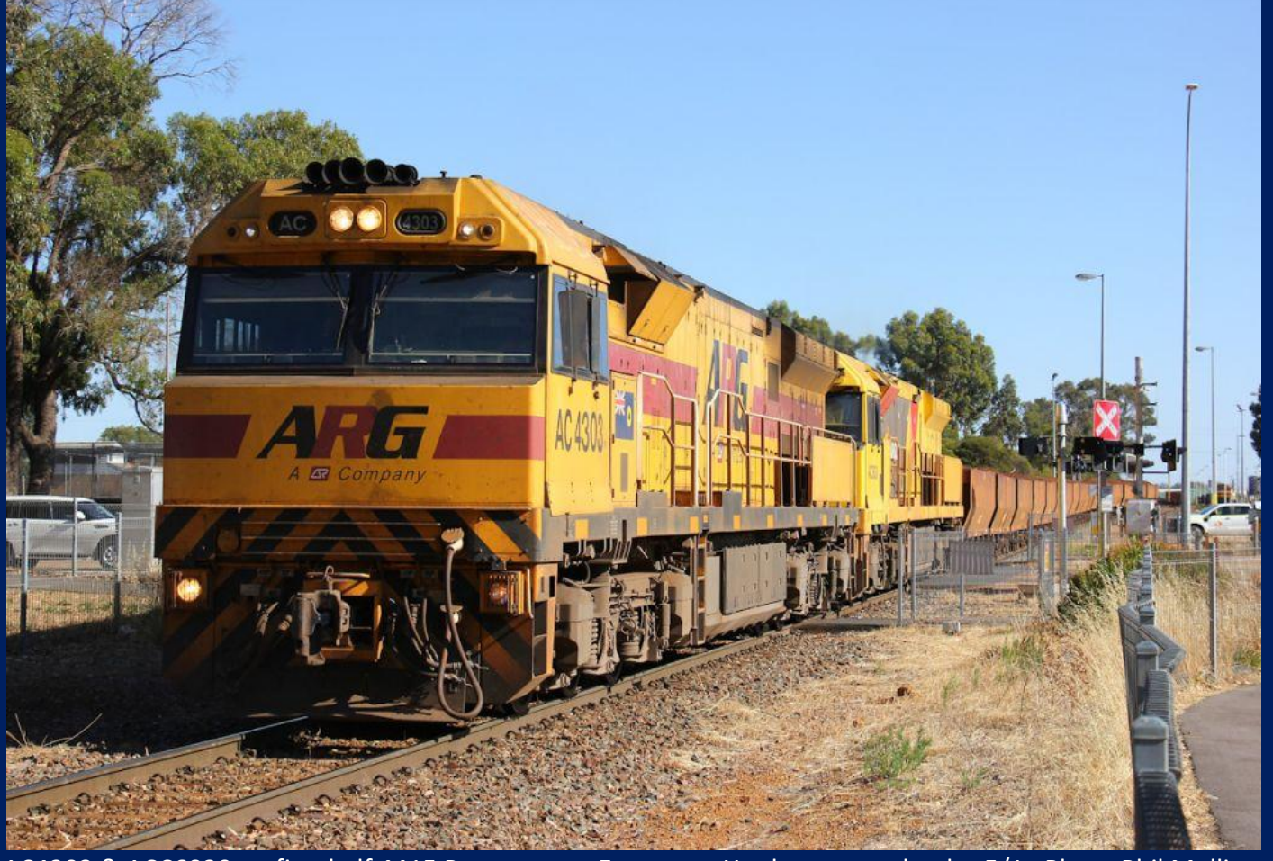
AC4303 & ACC6030 on first half 4415 Portman ore Esperance Yard to port unloader 5/1.