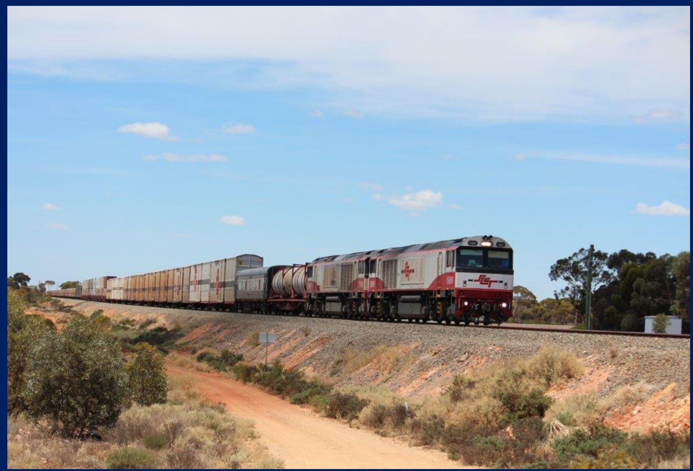
CSR003 & CSR008 on 5MP9 SCT freight that with new MB/BM services will see more CSRs in WA 22/1.