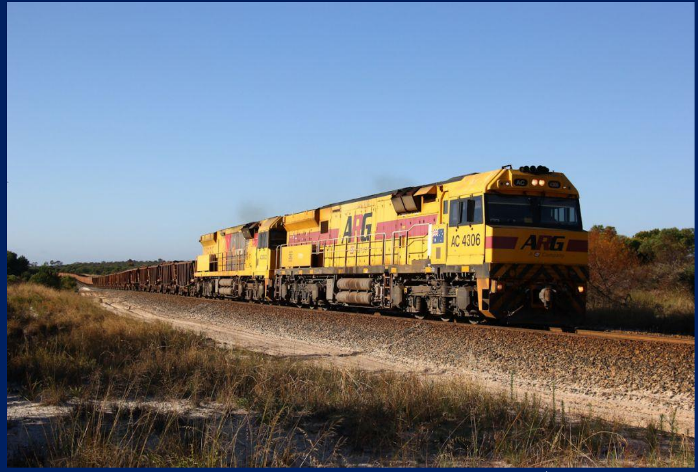
AC4306 & ACC6032 on 4416 empty Portman Esperance Koolyanobbing ore Myrup 4/01.