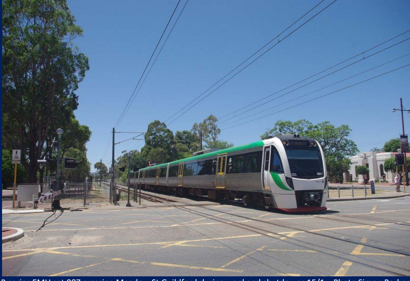
B series EMU set 087 crossing Meadow St Guildford during weekend shutdowns 15/1.