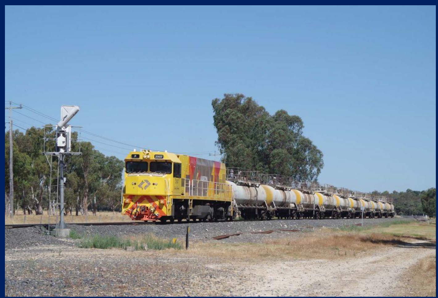
P2507 on 2850 caustic tankers at Harbour Junction Bunbury January 9th.