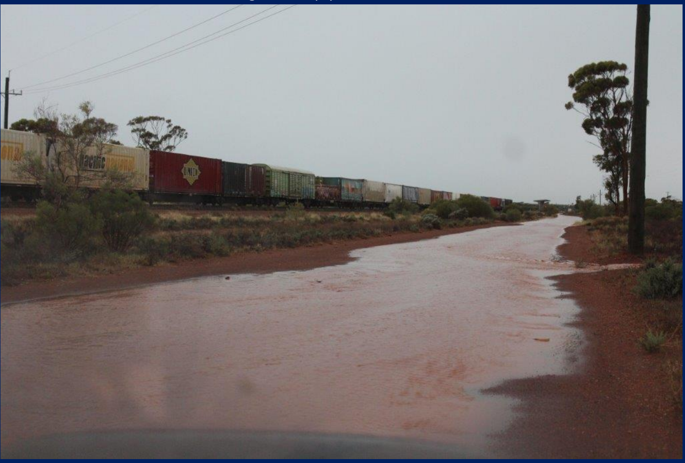
Access road in Parkeston turned into a mini river following heavy rainfall 29/1.