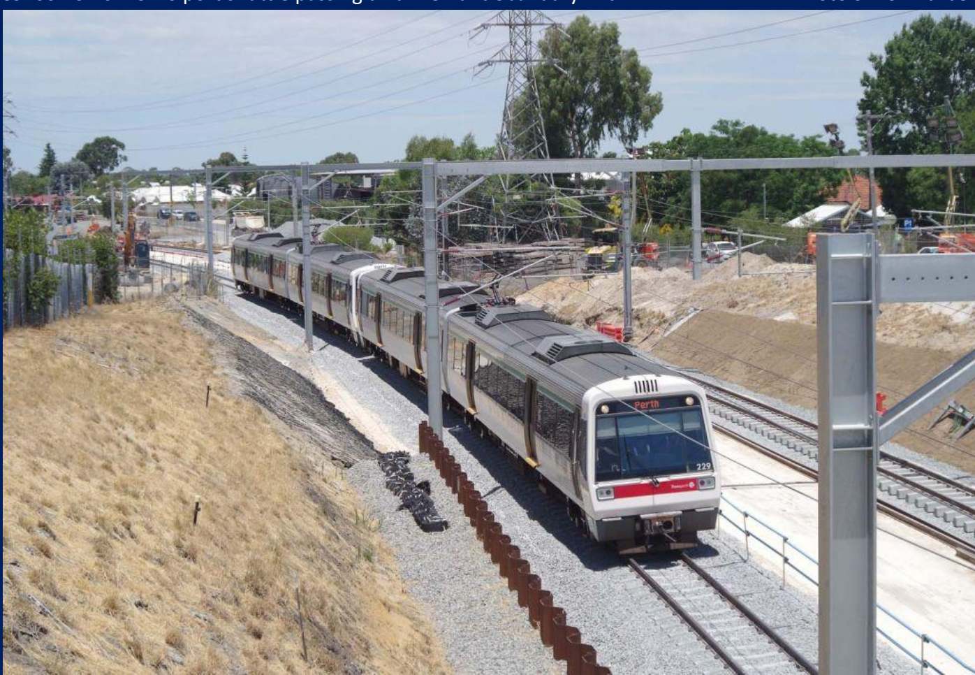
A series EMUs 29 and 44 running wrong line on up main at Victoria Park January 18th.