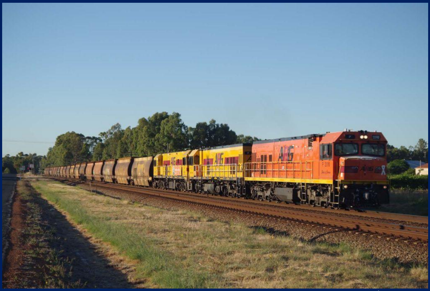
P2516, P2510 & PA2819 on 2305 empty woodchip wagon movement to Albany at Herne Hill 2/1.