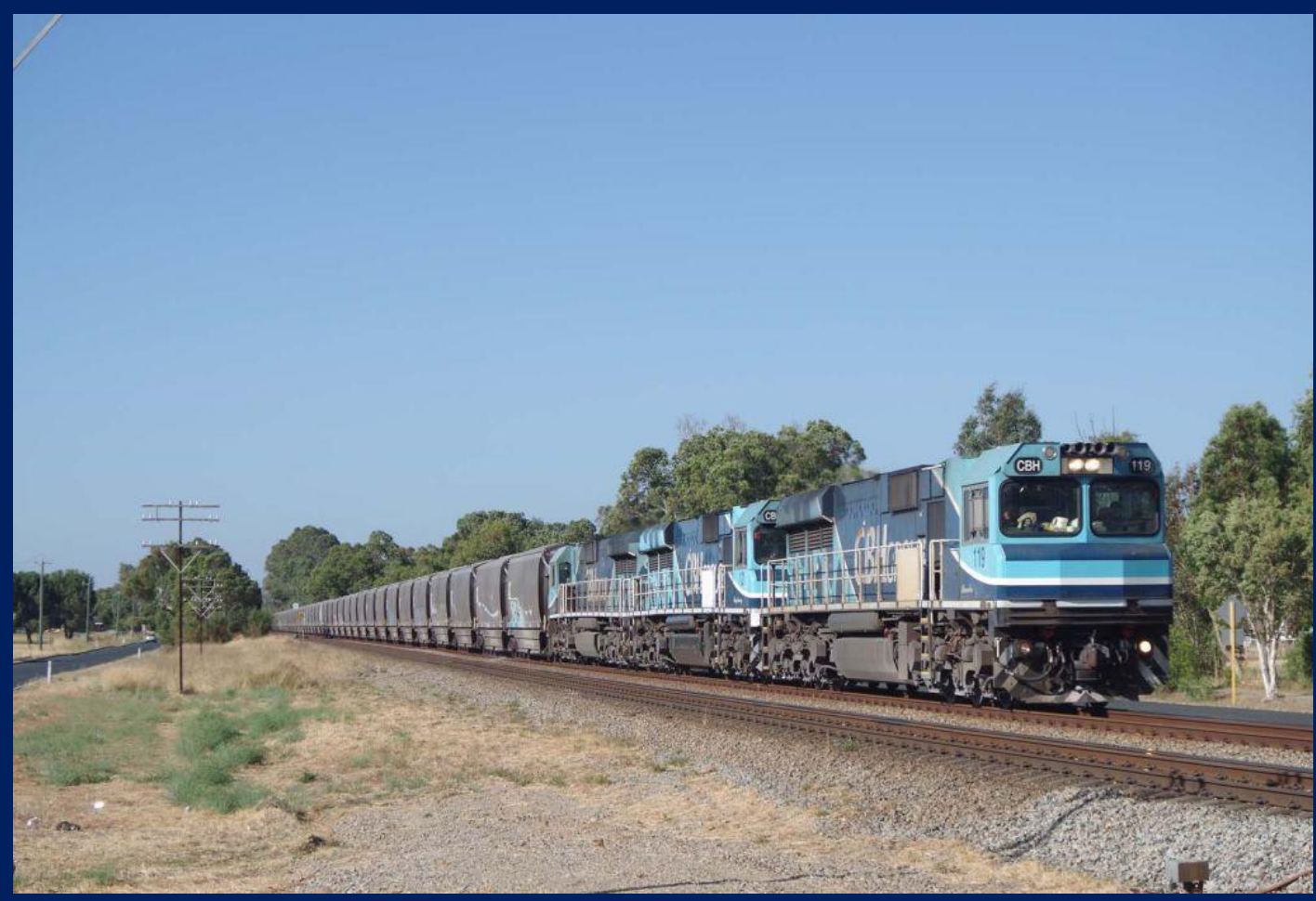
CBH119, CBH121 & CBH118 on 7S56 Watco grain Herne Hill January 7th.