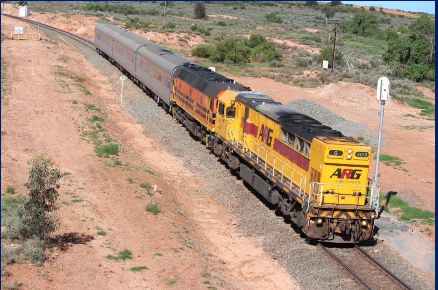
Q4019 on 3C74 hauls 2210 and AK car inspection train Parkeston to West Kalgoorlie 14/2.