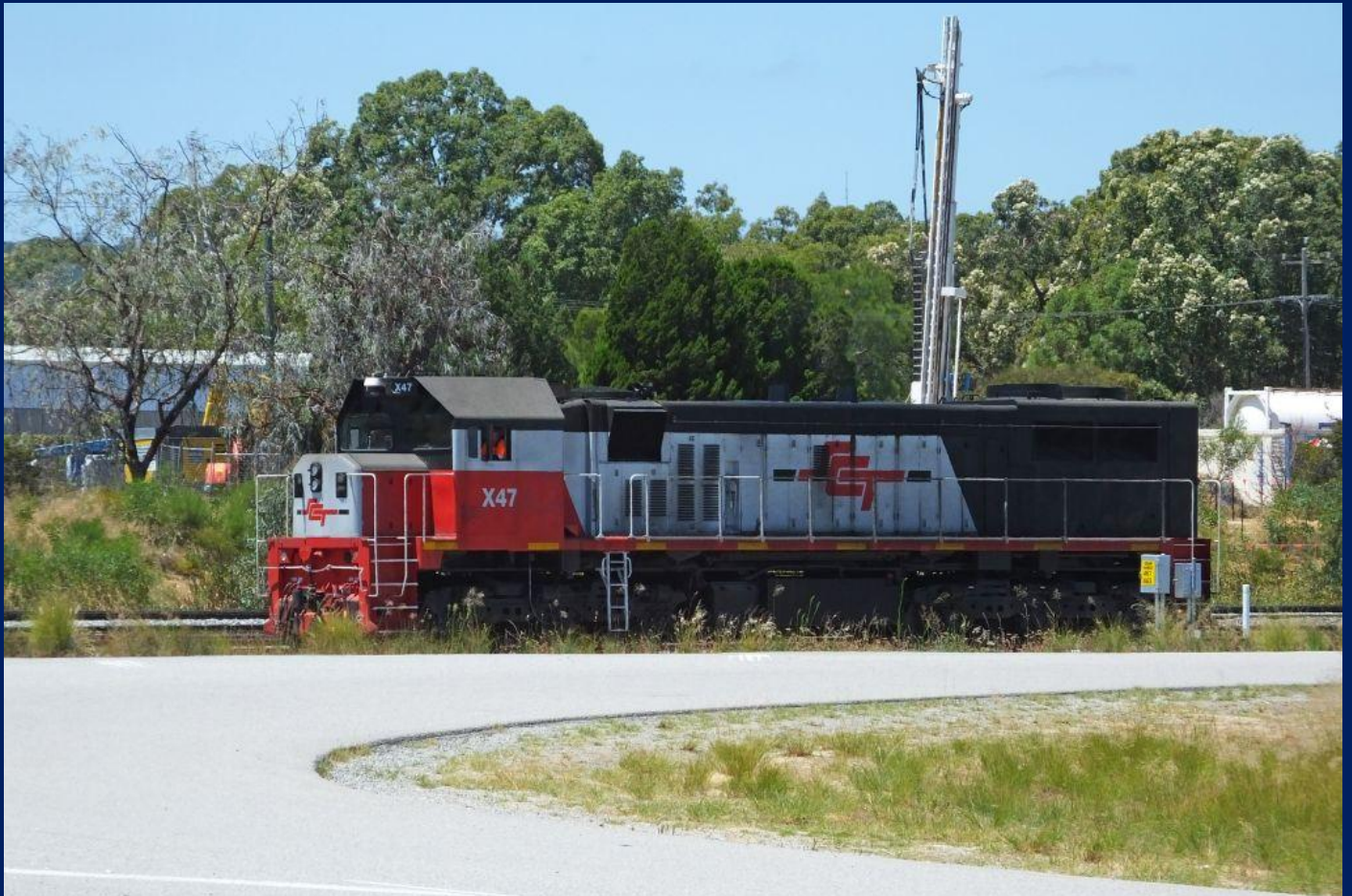
SCT shunter X47 in dead end Forrestdfield waiting arrival of MP9 February 5th.