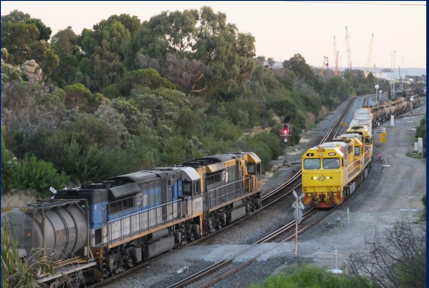
LDP004 & LDP003 late 5MP1 crossing Q4007, Q4006 & LZ3106 on 5025 Kalgoorlie freight Forrestfield 16/2