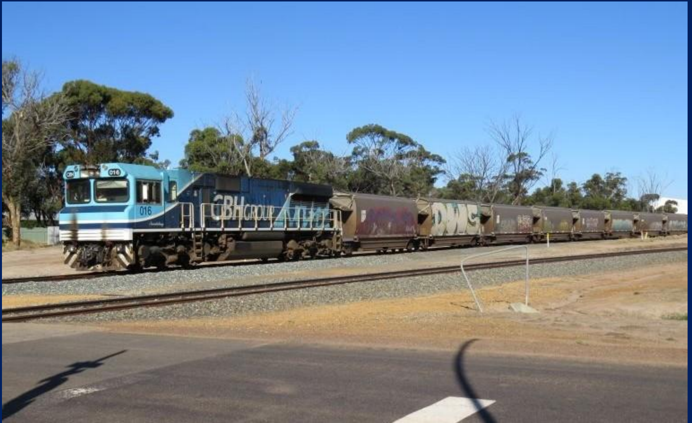
CBH016 loading Watco grain at Broomehill February 16th.