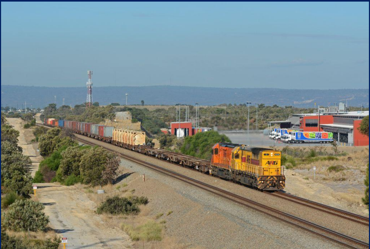
Q4006 & LZ3109 on 3170 freight though Jandakot February 14th.