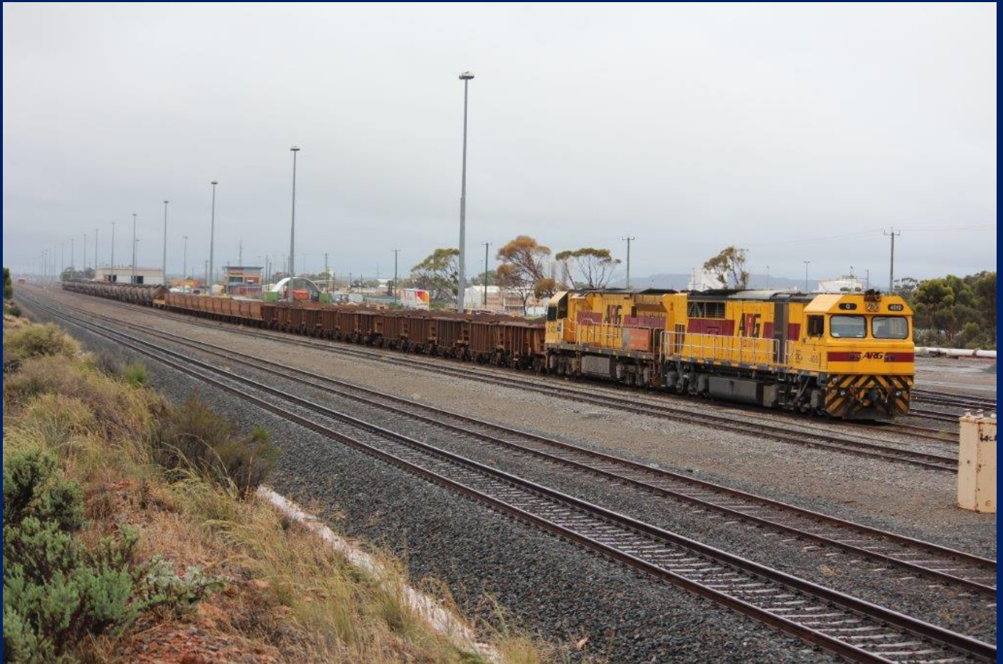
Q4010 & AC4302 on 2443 empty Esperance fuel and ore cars at WEK 30/1.