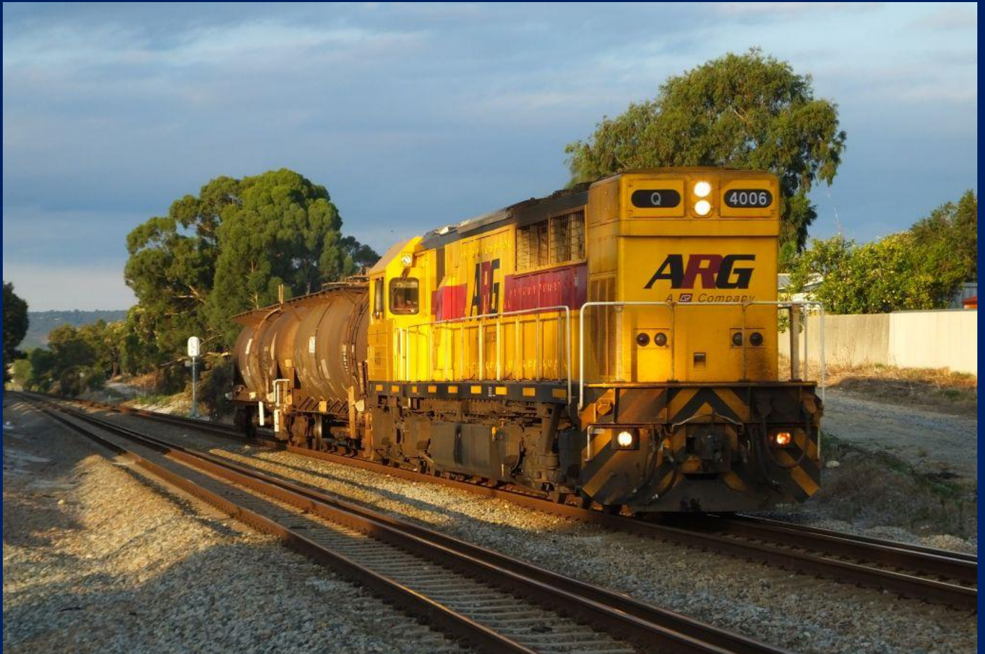
Q4006 on 4170 2xCaltex tankers Forrestfield to Kwinana at Thornlie February 15th.