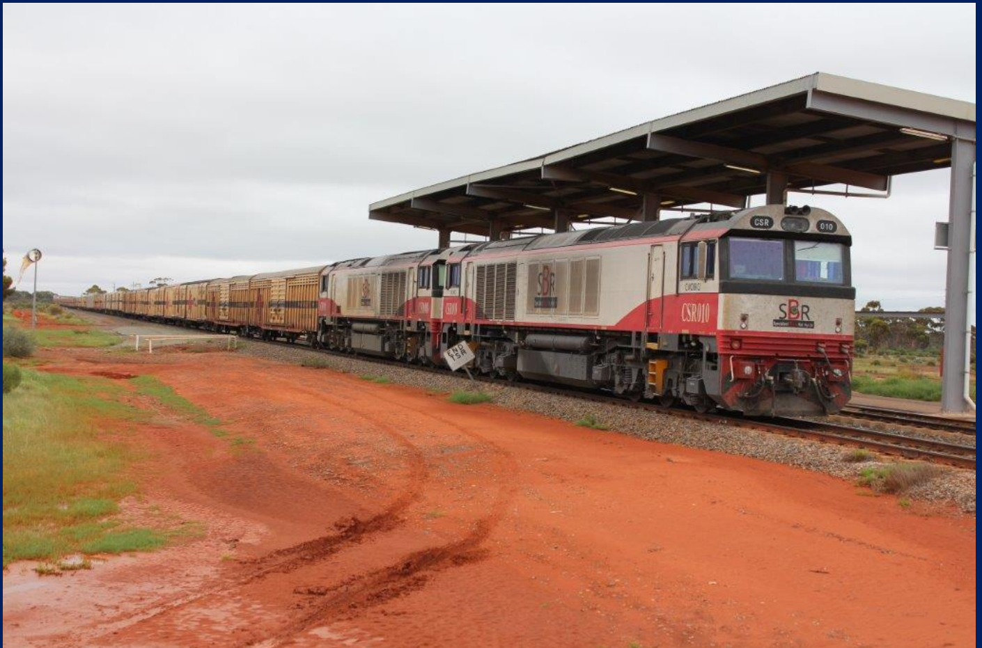
CSR010 & CSR008 on 5MP9 hauling out of Parkeston to stable Curtin loop 12/2.