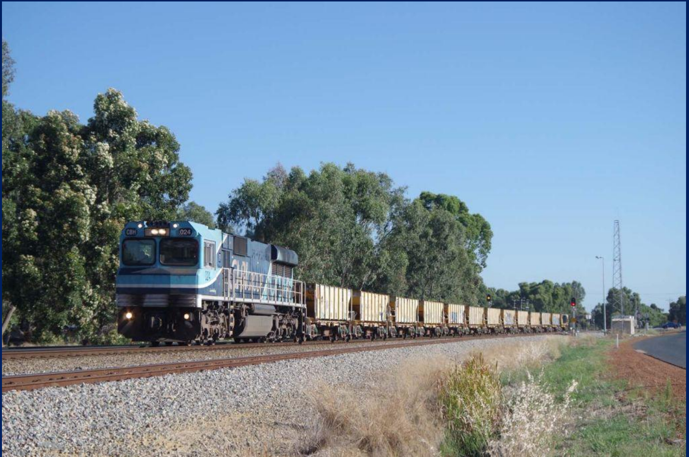
CBH024 on 2BT1 empty ballast train to Kwinana to Wagin at Millendon Junction 20/2.