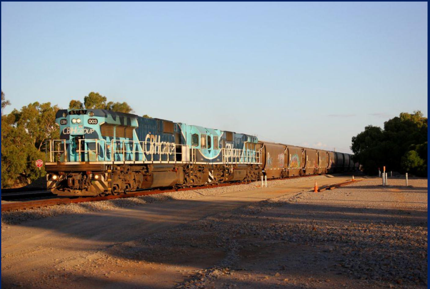
CBH003 & CBH002 cab to cab loaded grain to CBH Geraldton terminal at Narngulu 6/2.