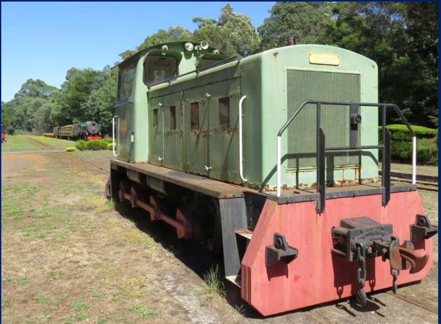
Ex Pemberton Mill Comeng shunter with V class steam loco and train stored in Pemberton Yard 16/2.