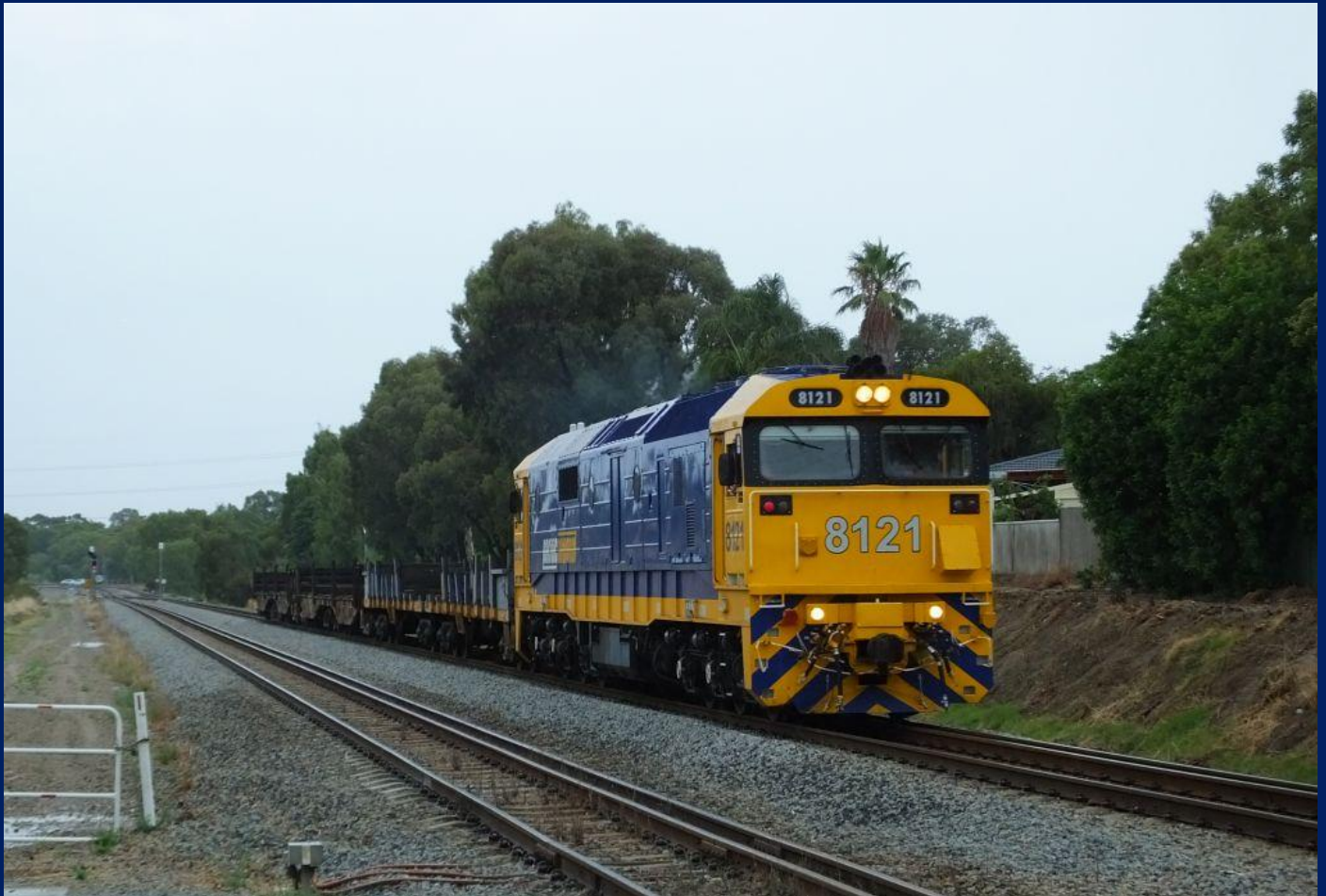
8121 on 6P32 empty 2xpack rail wagons from flashbutt to PFT Kewdale Hazelmere 10/2.