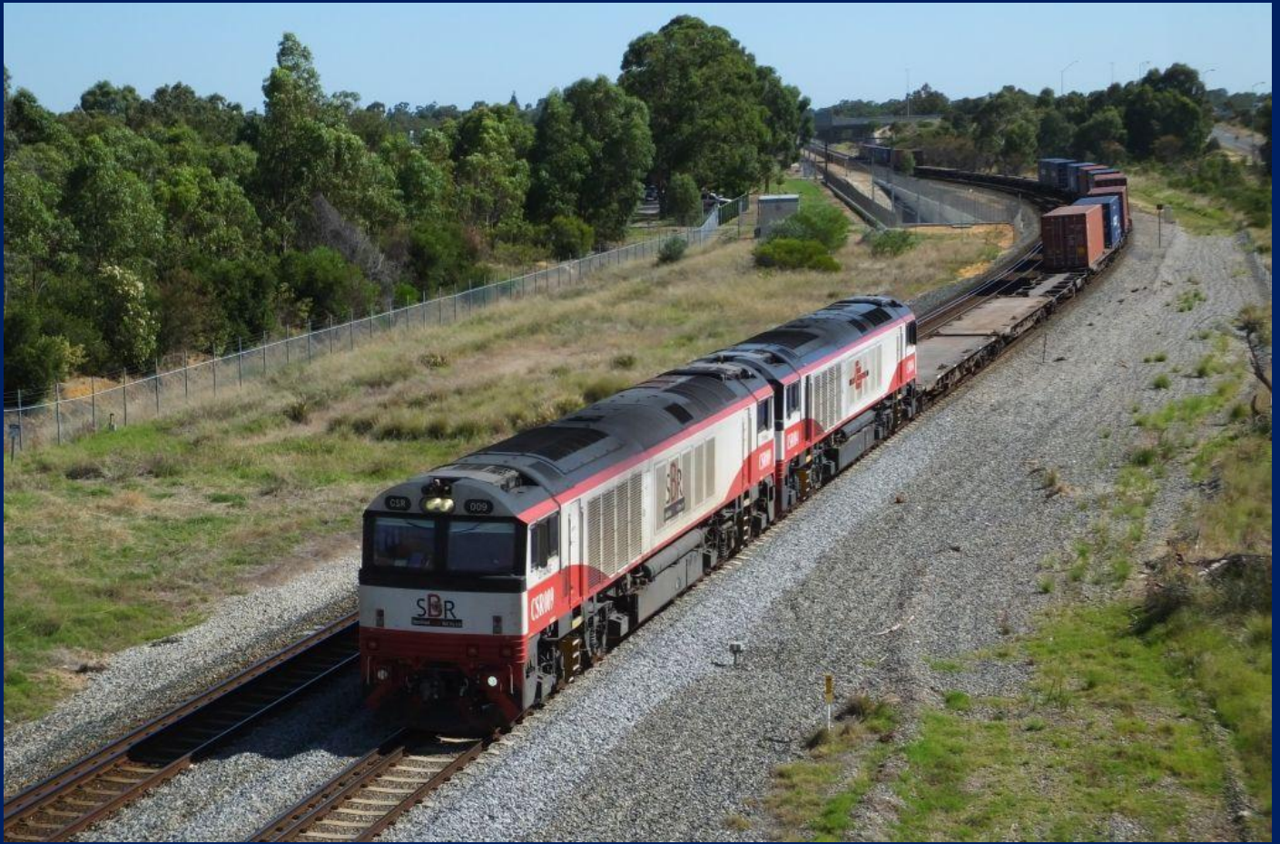
CBH009 failed CBH004 on 1143 port shuttle North Port to Forresterfield at Kenwick 26/2.