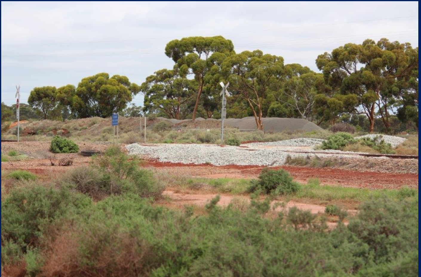
Repaired track at 1773.866km where roadbed under 30 sleepers washed away 11/2.