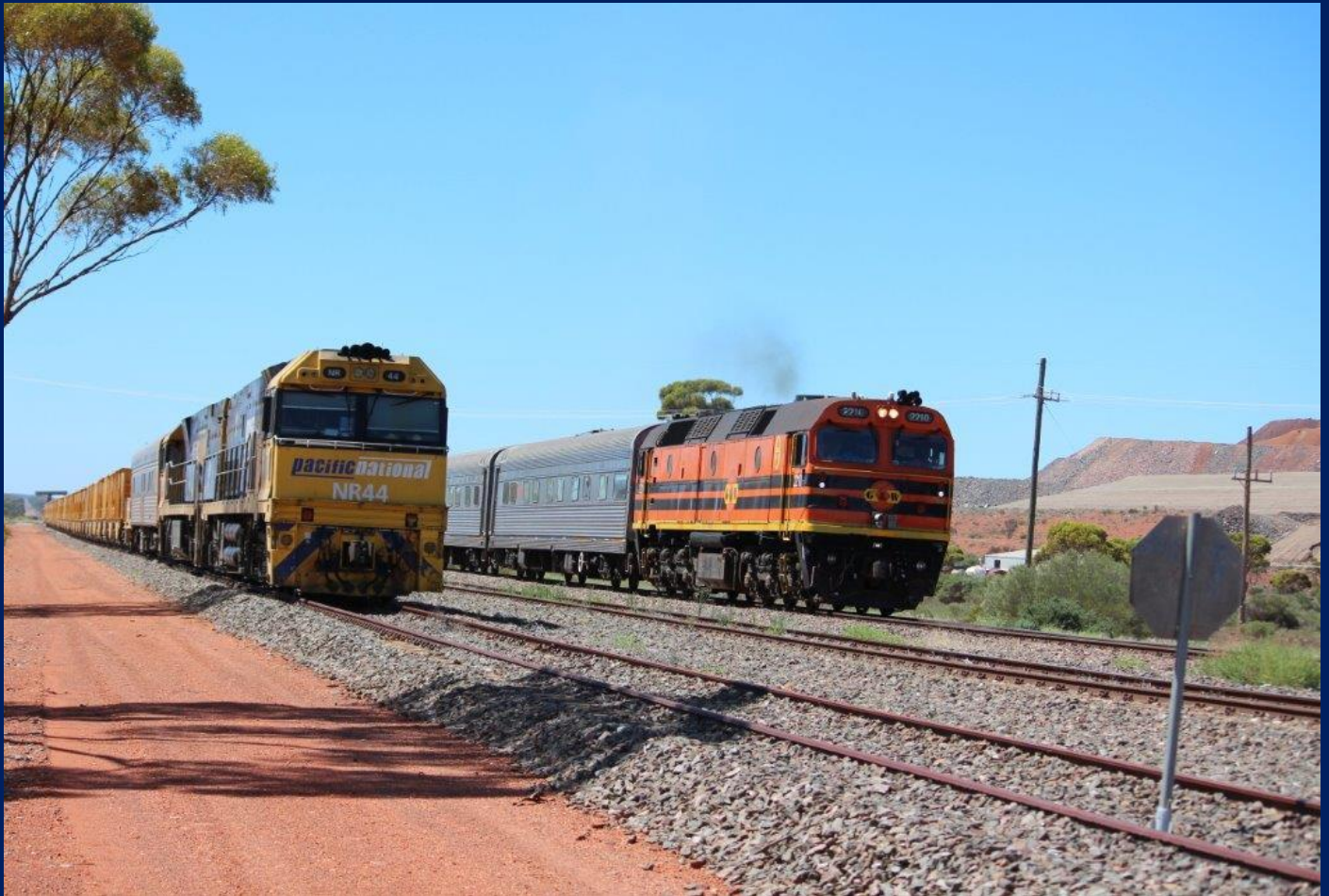
2210 on PK82 AK car inspection train bypasses stabled NR44 & NR93 Parkeston 14/2.