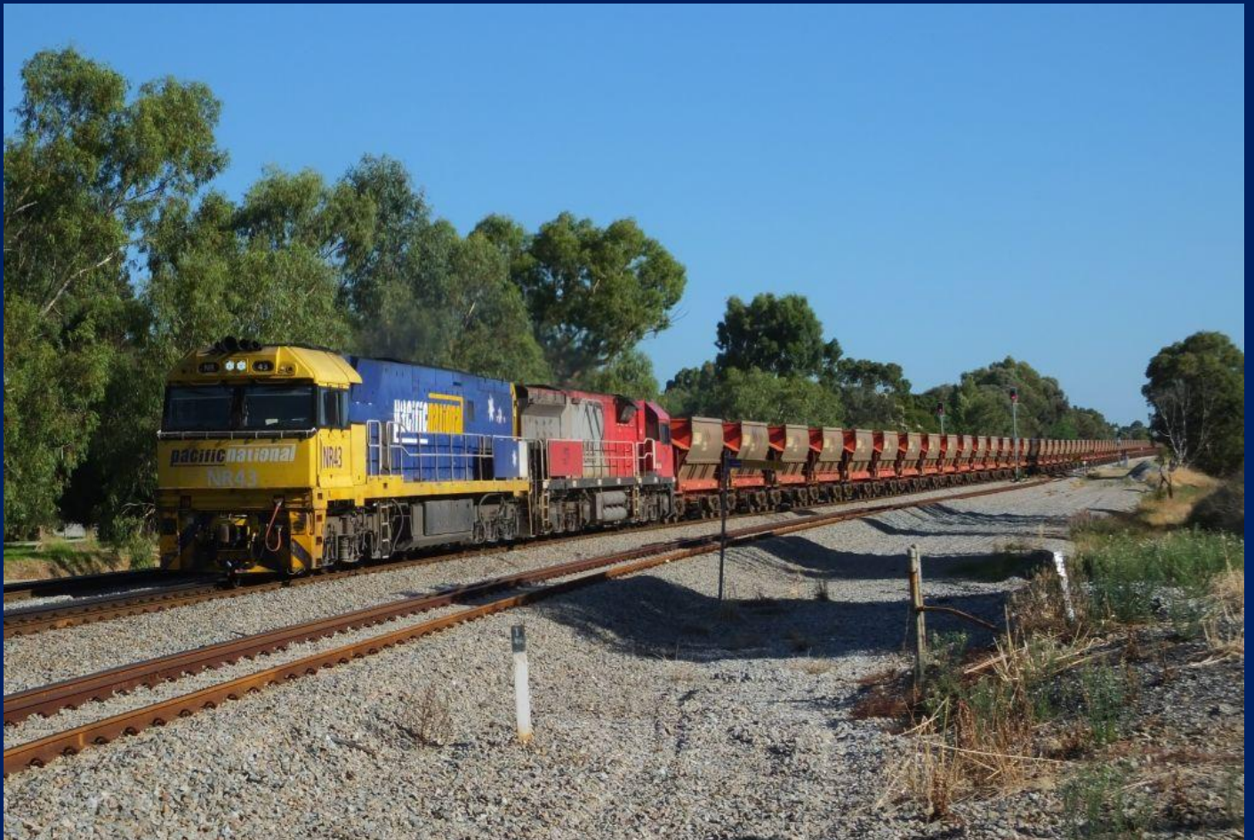
NR43 & MRL003 on 1035 empty Polaris ore to Mt Walton at Woodbridge 26/2.