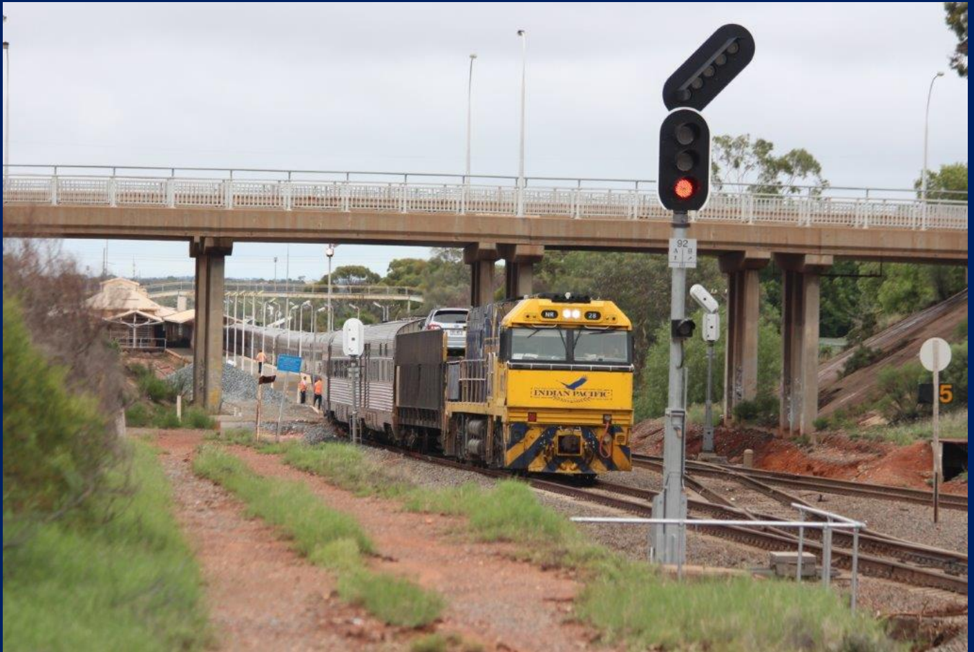
NR28 on Indian Pacific with crew watering coaches at Kalgoorlie station as line to Perth is closed 12/2.