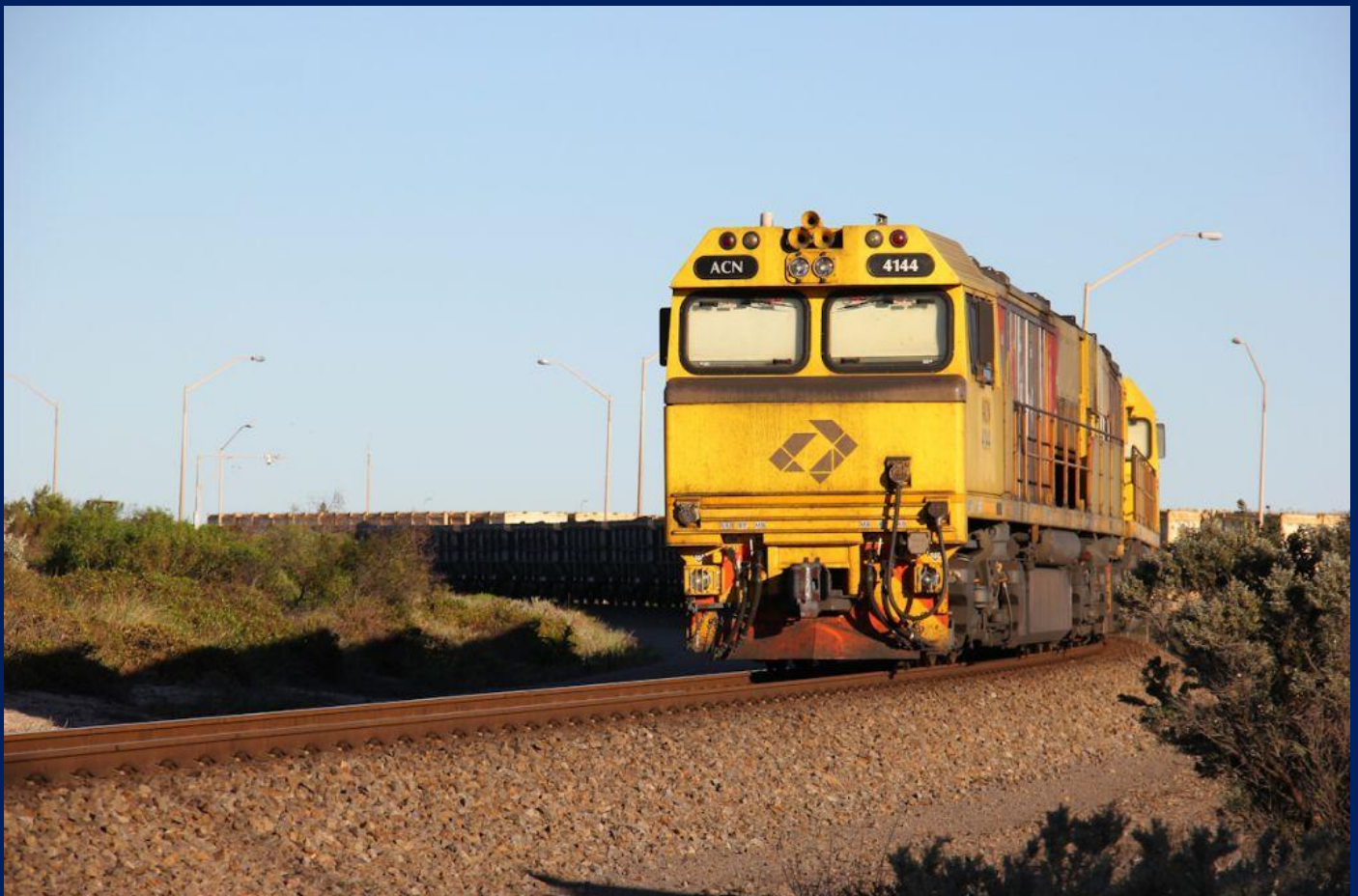
ACN4144 & ACN4168 DPU ACN4167 on loaded Karara ore Beachlands nearing port 6/2.