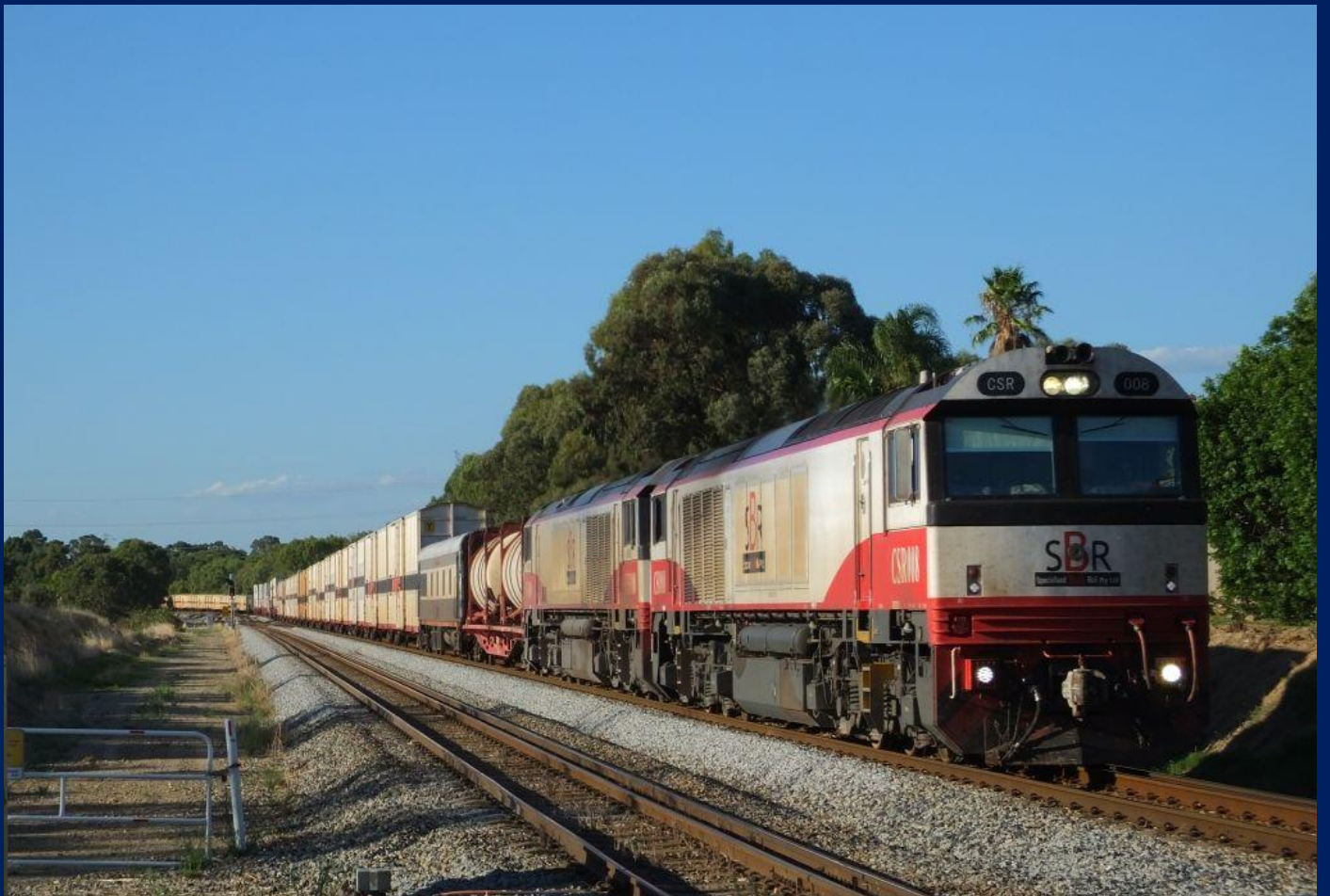
CSR008 & CSR010 on very late 2MP9 SCT freight at Hazelmere February 16th.