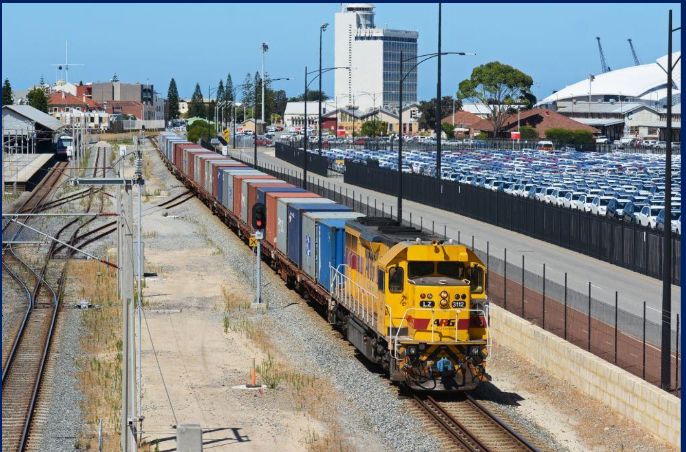
LZ3112 on North Port container train 5196 on dual gauge line thru Fremantle 16/2.