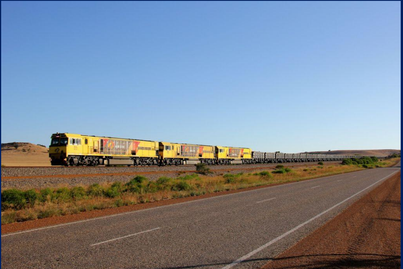
ACN4152, ACN4149 & ACN4151 on 5764 empty Karara ore to mine Moonyoonooka 2/2.