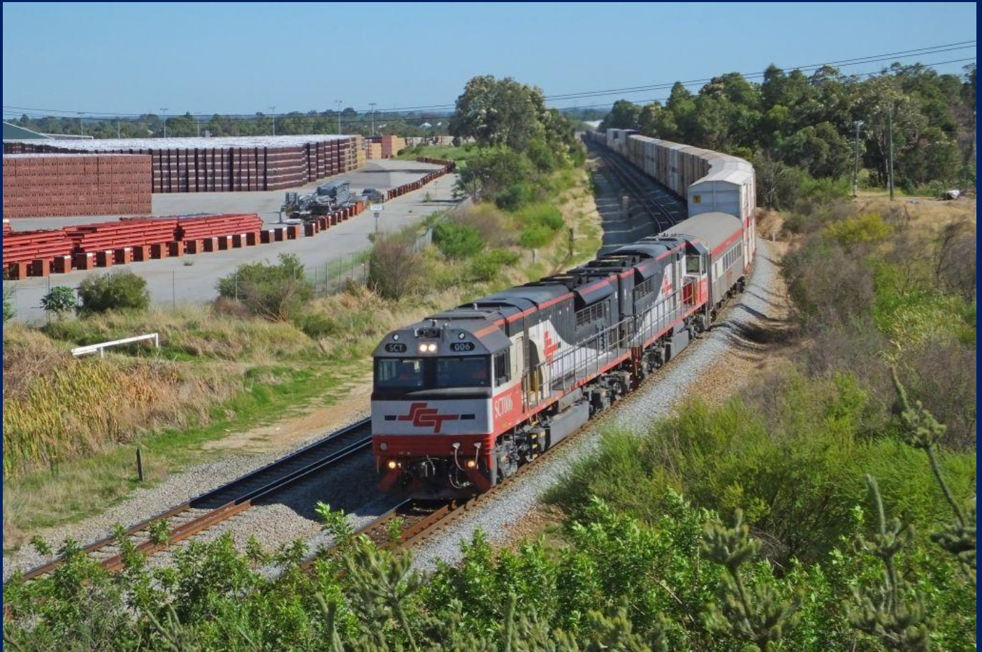
SCT006 & SCT014 on 3MP9 SCT freight with no fuel pod South Guildford 24/2.