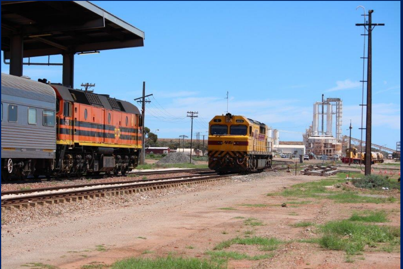
2210 on PK82 AK cars, Q4019 on 3C71 light engine, BHP49 shunting Parkeston 14/2.