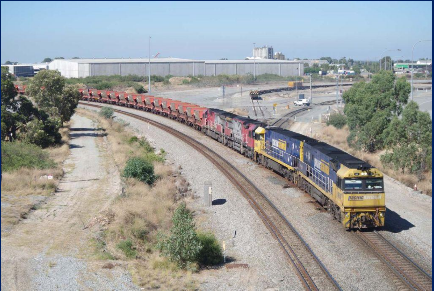
NR38, NR66, failed MRL002 & MRL001 on 4033 empty Polaris ore Kewdale 1/2.