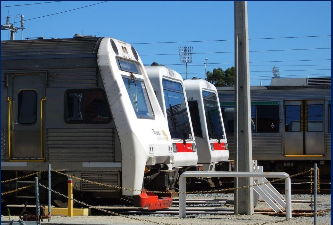
ADP103 stabled with EMU sets 325 and 318 in Claisebrook RDC February 19th.