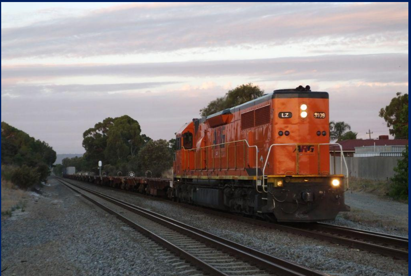
LZ3109 on 3170 container train Thornlie February 7th.