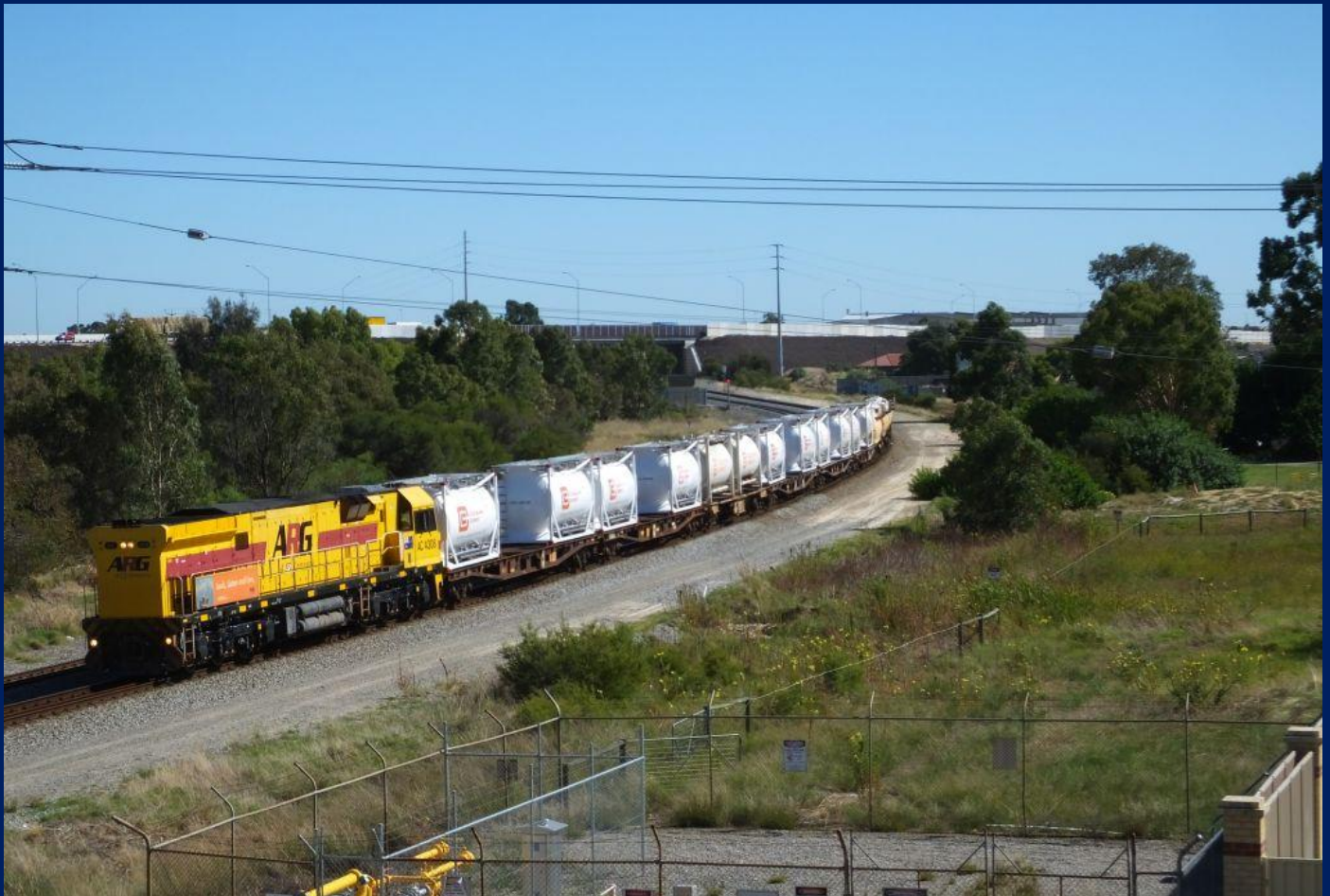
AC4308 load trial on 6194 Soundcem shunter note mainly containers Wattle Grove 24/2.