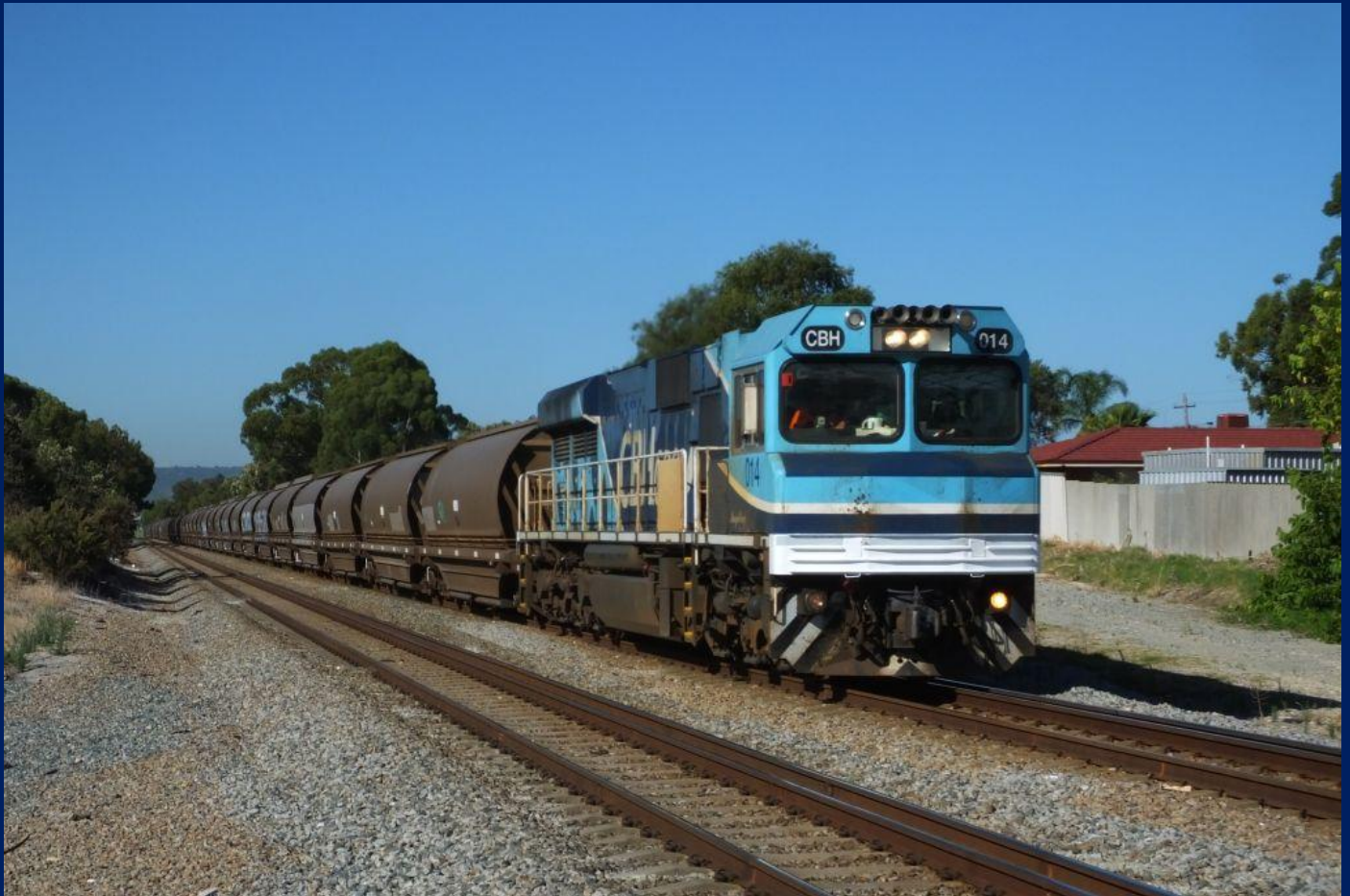
CBH014 on 2K02 transfer hired Aurizon XT fleet Forrestfield CBH Kwinana Thornlie 27/2.