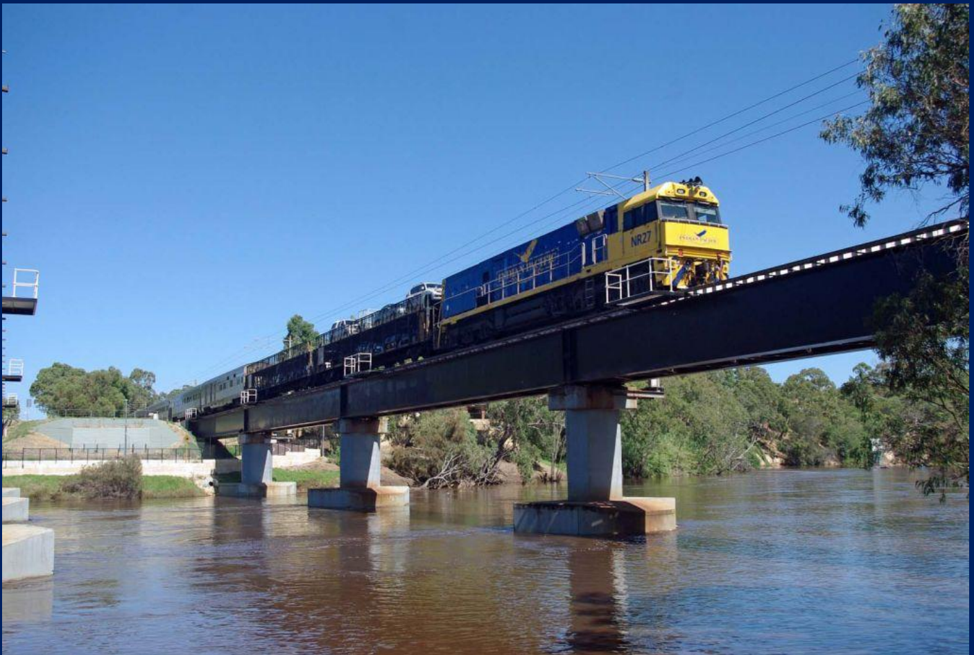
NR27 on 1PA8 Indian Pacific crossing flooded Swan River at Guildford February 19th.