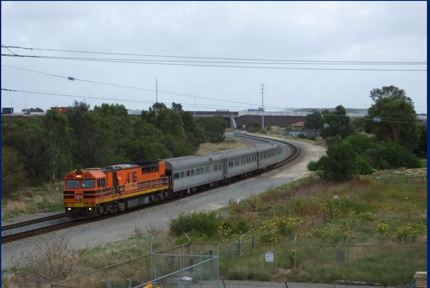
Q4009 on 3AK2 AK car inspection train to Fremantle and Kwinana Wattle Grove 21/2.