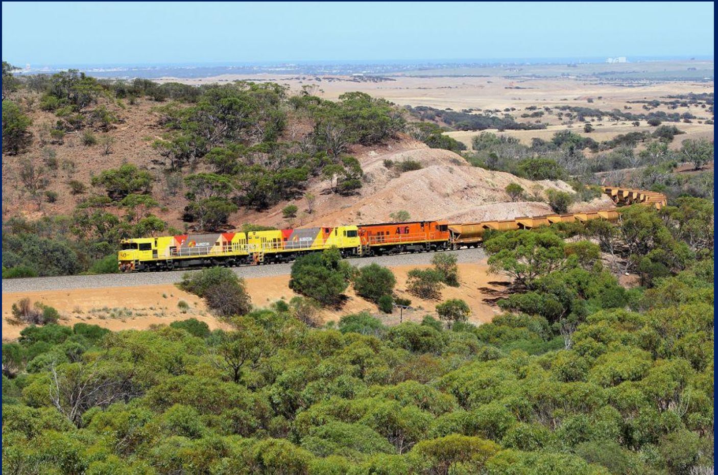
P2517, P2512 & P2509 on 1720 empty Mt Gibson Perenjori ore at Bringo 19/2.