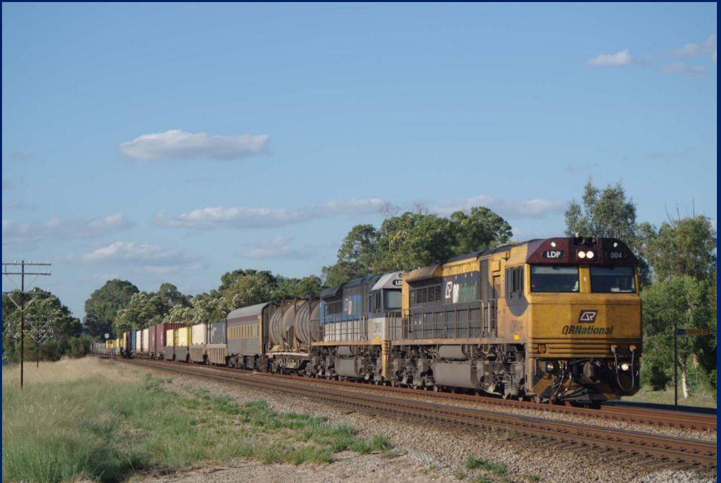
LDP004 & LDP003 on very late 5MP1 Aurizon intermodal Herne Hill February 16th.