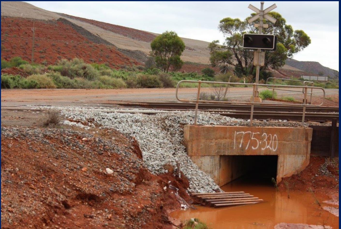
Repaired wash away at 1775.320km on ARTC main line at east end of Parkeston 11/2.