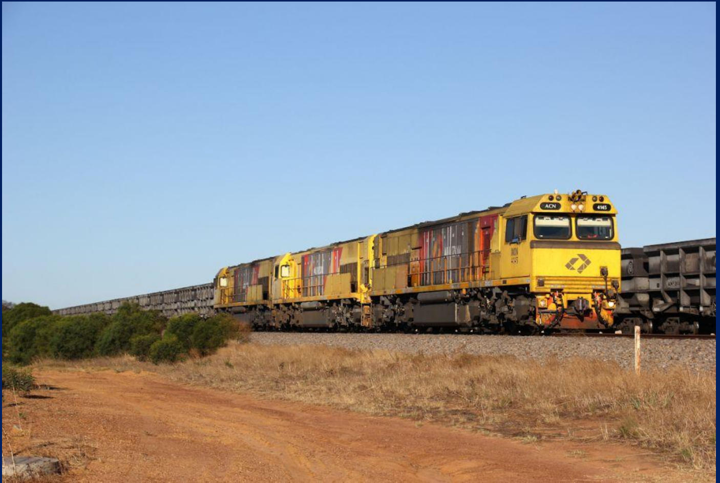
ACN4145, ACN4142 & ACN4146 on 5763 loaded Karara ore to Geraldton at Grants 2/2.