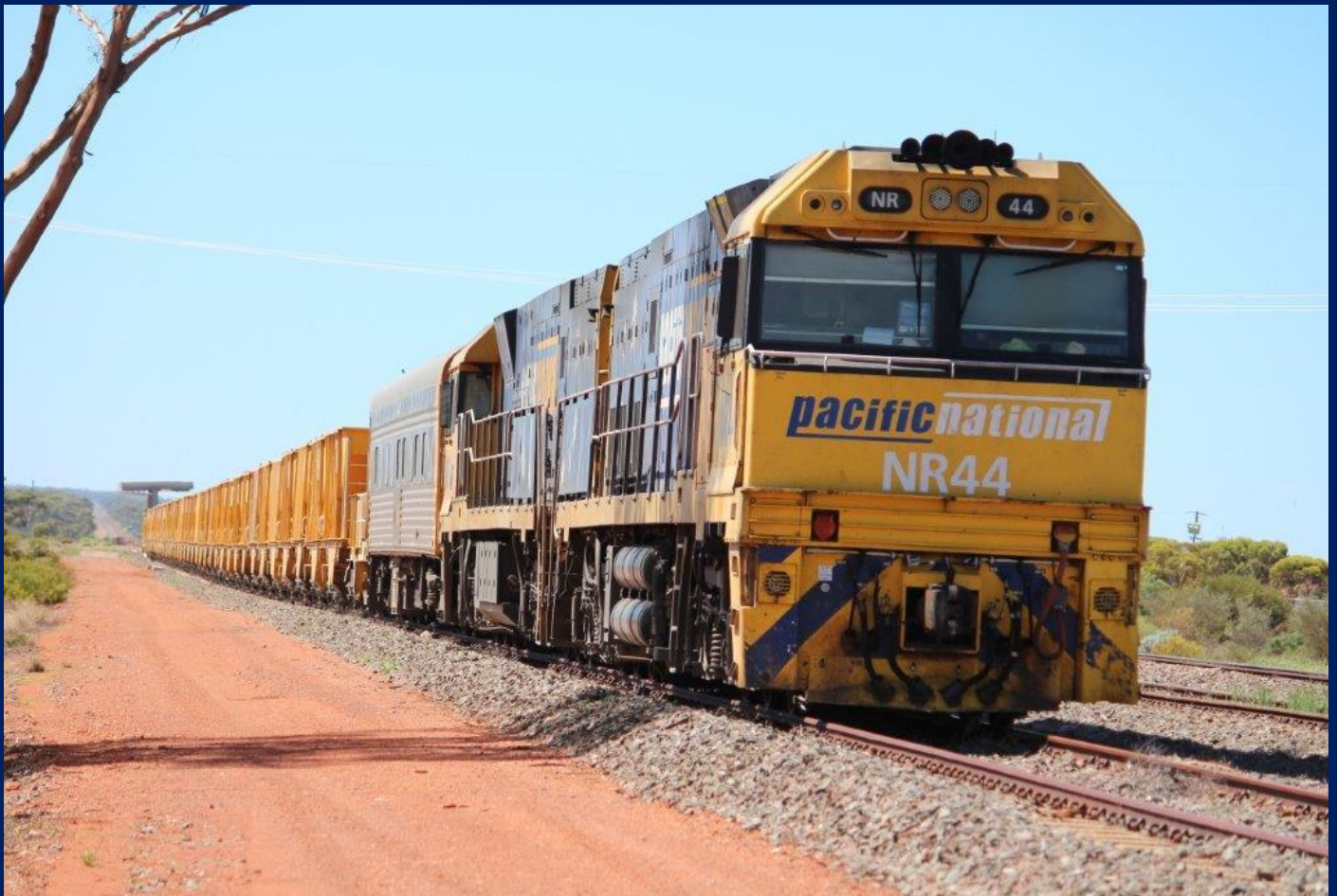
NR44 & NR93 on ARTC ballast train stabled in Engineers siding Parkeston 14/2.