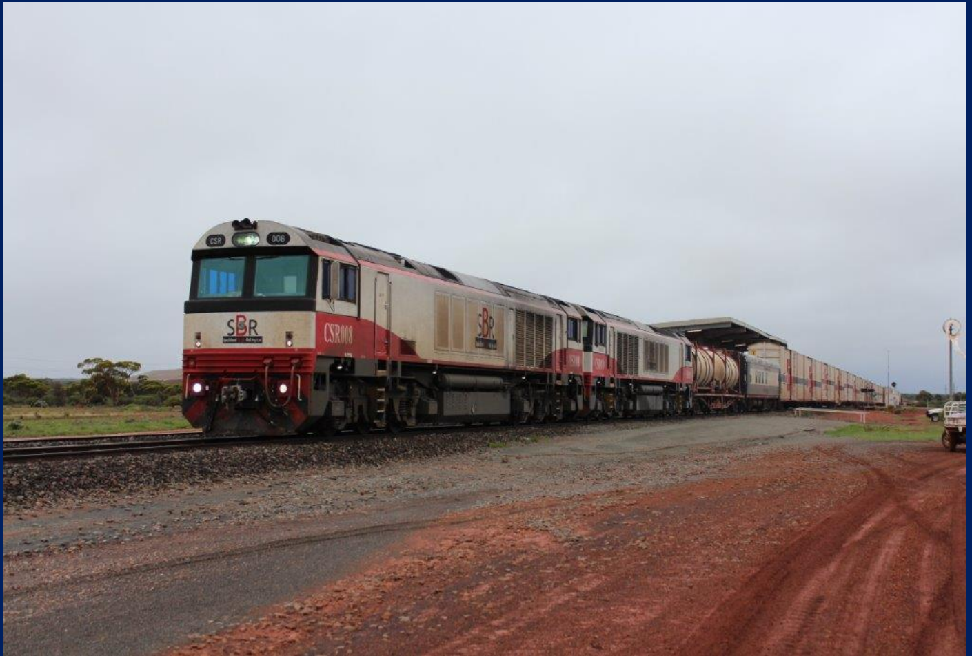
CSR008 & CSR010 on 5MP9 crossing Bulong Road Parkeston to refuel locos and some wagons 12/2.