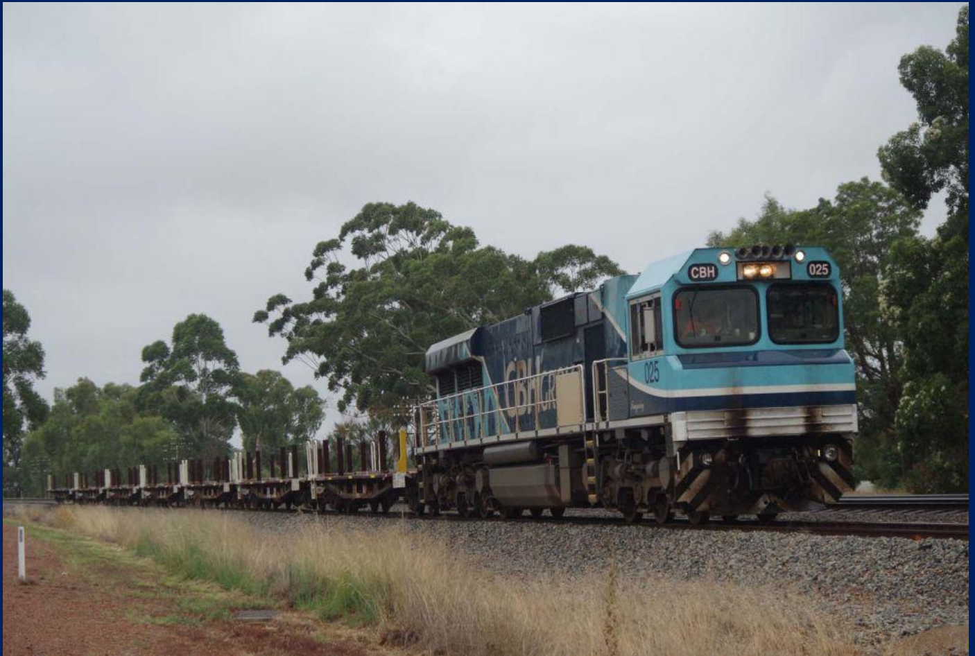
CBH025 on 6RT1 empty rail train from Narngulu about to come off Midland Railway line Millendon Jct 10/2