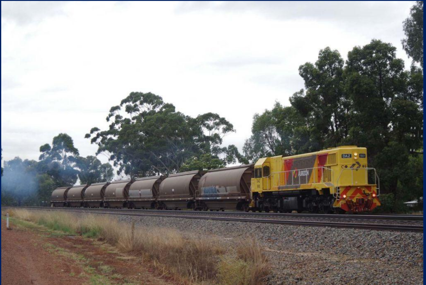
DAZ1901 on 6752 XT grain hoppers ex Avon Yard to Kwinana Millendon Jct 10/2.