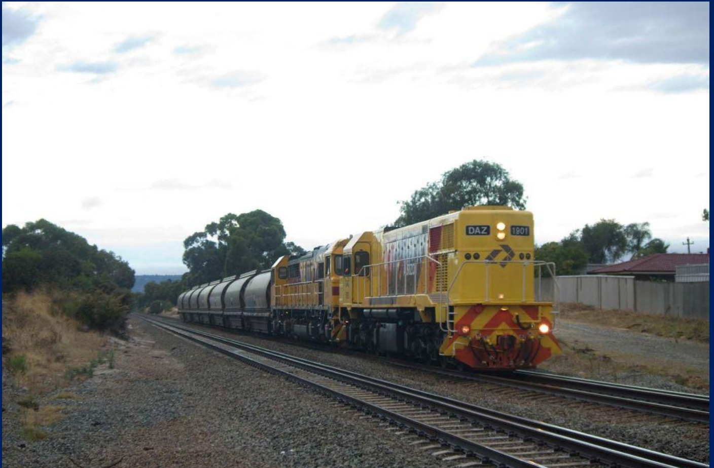
DAZ1901 & S3304 [attached Forrestfield] 6752 XT wagons to Kwinana Thornlie 10/2.