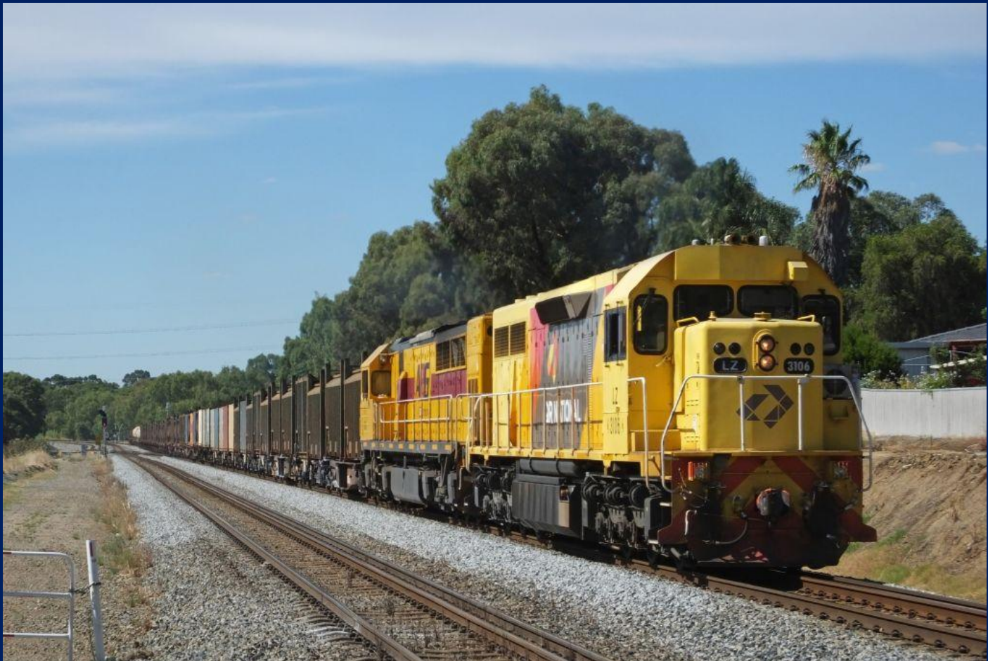
LZ3106 & Q4019 on 3430 empty sulphur Malcolm to Forrestfield Hazelmere 1/2.