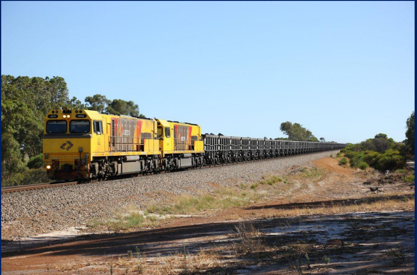
ACN4142 & ACN4146 on 7761 loaded Karara ore Bringo February 25th.