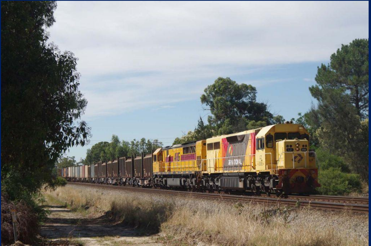
LZ3106 & Q4019 on late 3430 empty sulphur Swan View February 1st.