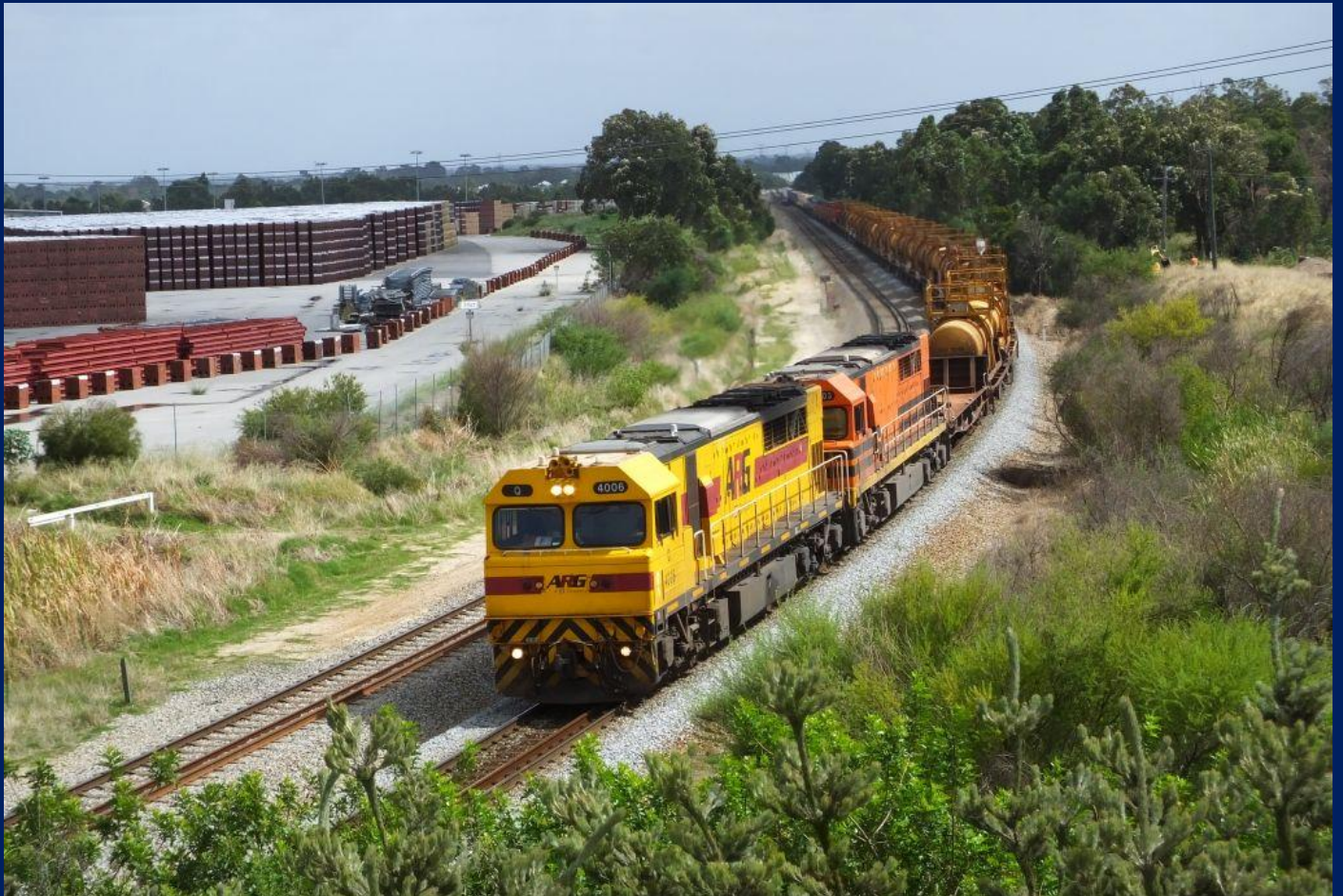
Q4006 & Q4003 on late 2426 Kalgoorlie Forrestfield freight South Guildford 21/2.