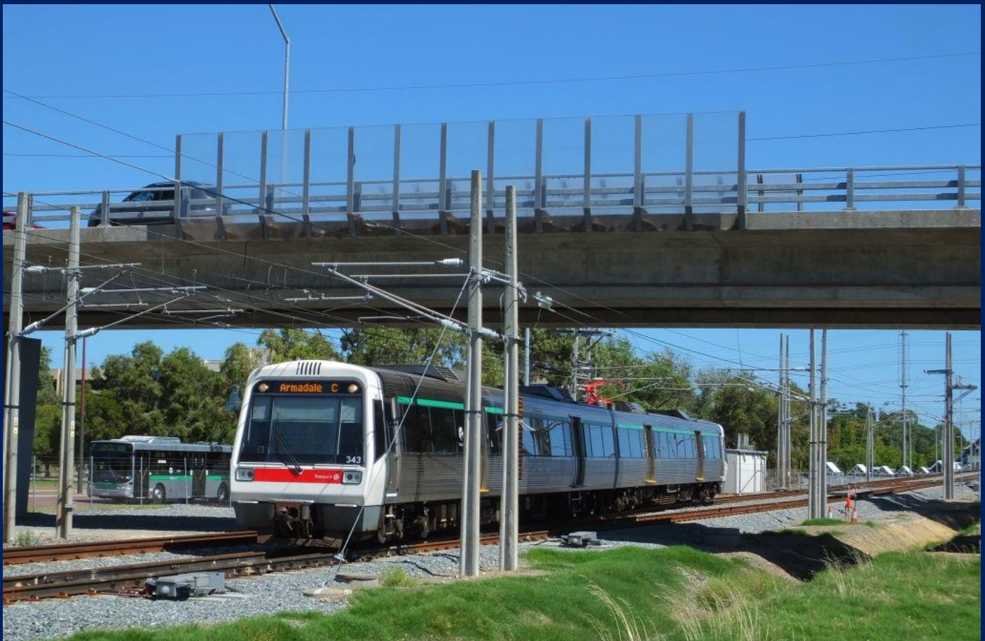
EMU set 43 crosses over to down main after departing Cannington during Stadium shutdown 19/2