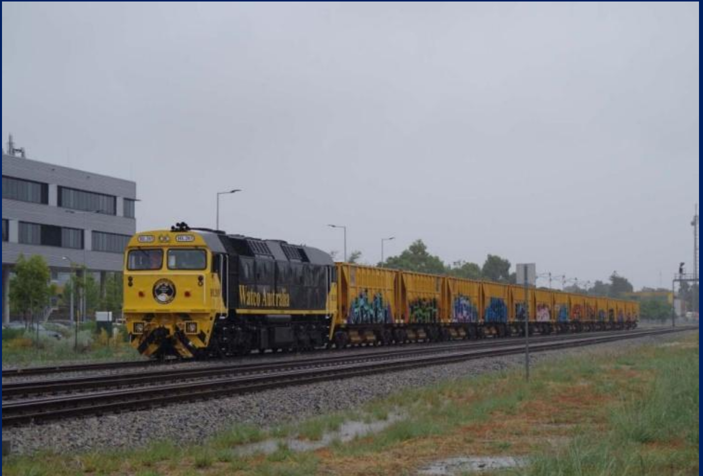
HL203 on 6WL2 empty ballast train in bidirectional Midland loop February 10th.