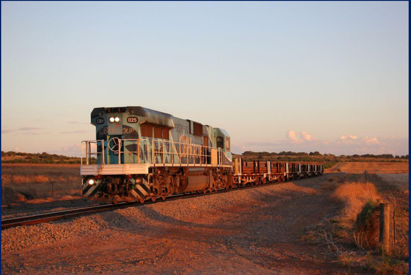
CBH025 on hire to Watco on rail train to go onto Perenjori line South Greenough 6/2.