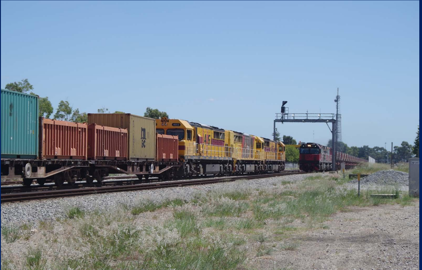
Q4019, Q4007 & Q4012 on 3426 Kalgoorlie Forrestfield freight crossing MRL003 & MRL002 on 4035 empty Polaris ore Kwinana Bulk Terminal Mt Walton at out of gauge detector Midland 22/2.