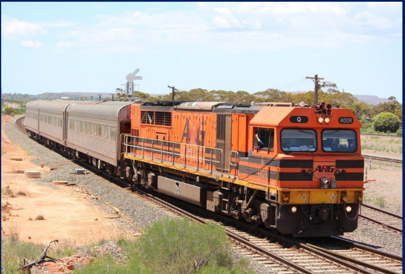
Q4009 on 5AK2 AK inspection train arriving WEK after running to Leonora 16/2.