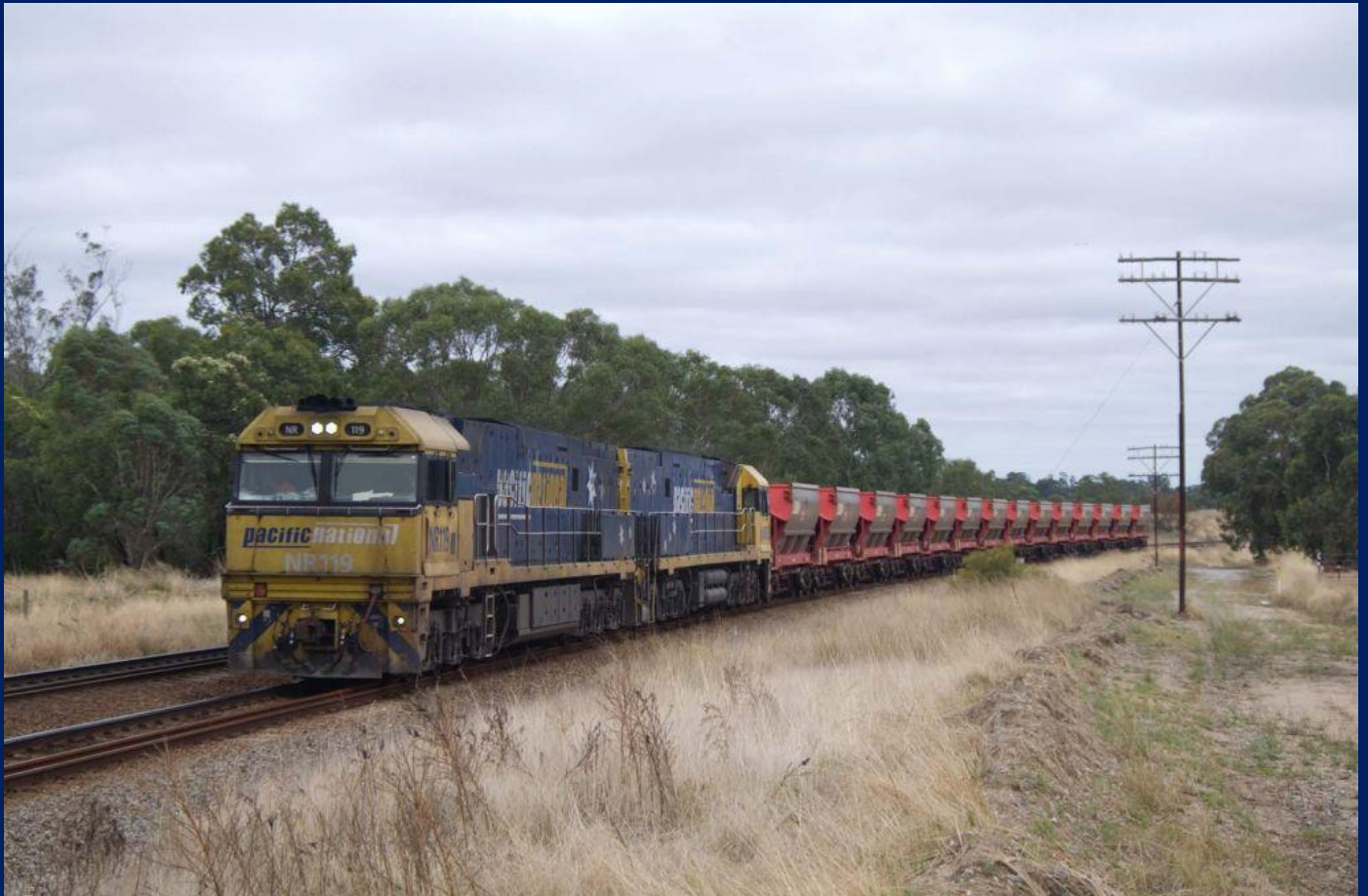
NR119 & NR97 on 5PG2 transfer of Mineral Resources wagons Grass Valley to PFT Kewdale 2/2.