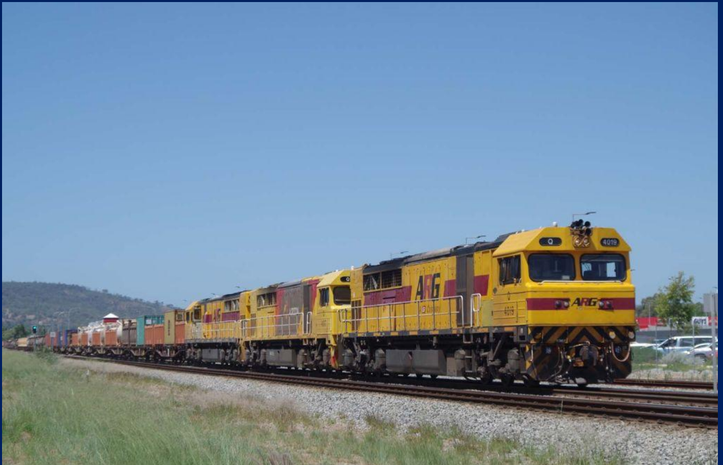
Q4019, Q4007 & Q4012 on 3426 Kalgoorlie Forrestfield freight Midland 22/2.