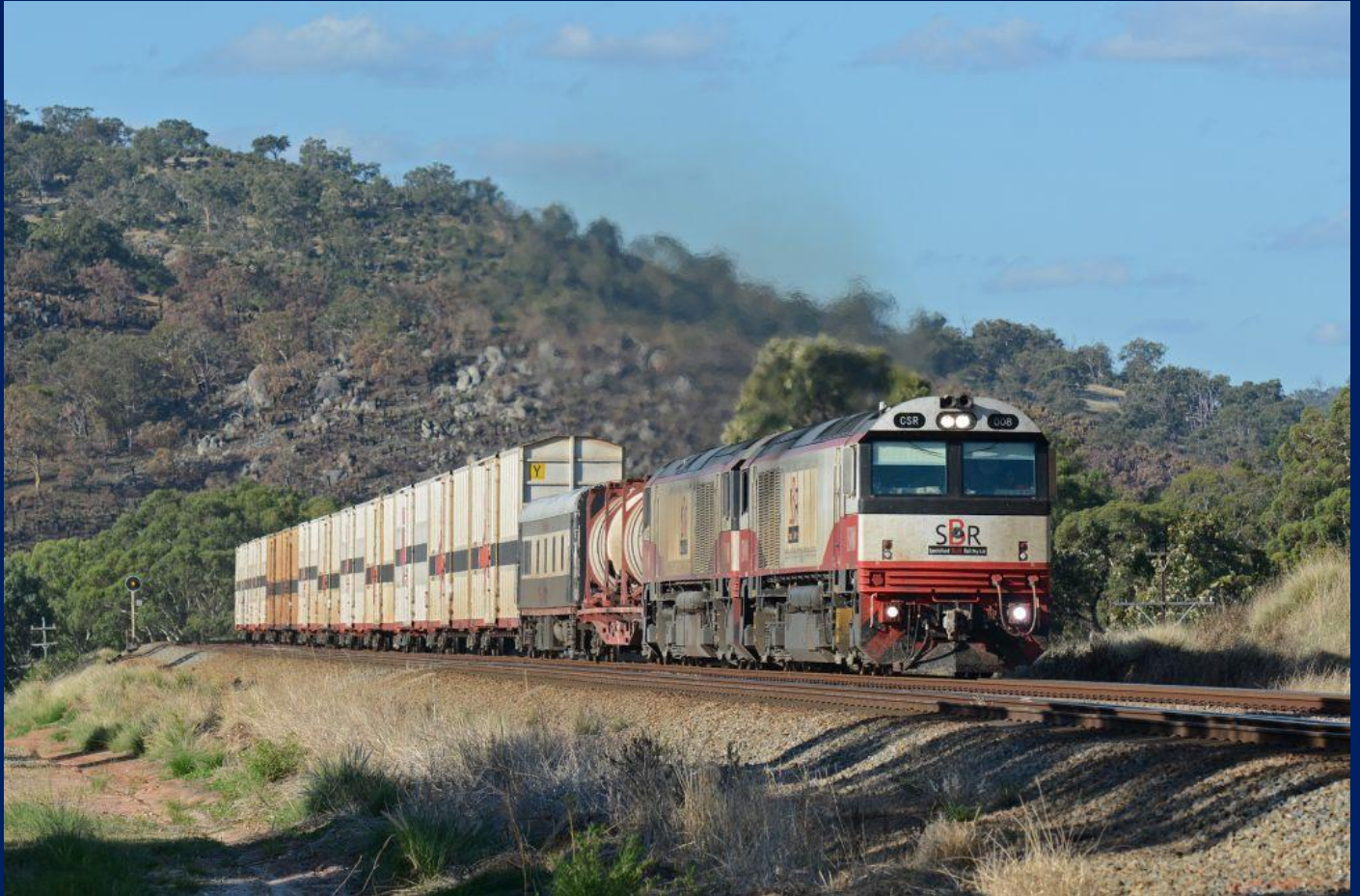
CSR008 & CSR010 on very late 5MP9 SCT freight at Brigadoon February 16th.