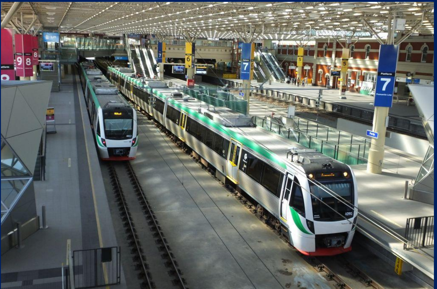
B series set 90 on Fremantle service set 57 on Midland service Perth Station 19/2.