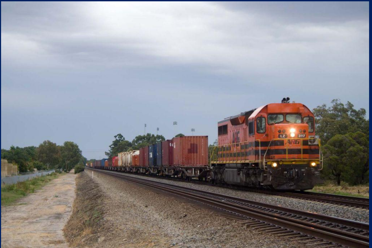
LZ3117 on 6025 Kwinana shunter with Kalgoorlie loading to Forrestfield Thornlie 10/2.