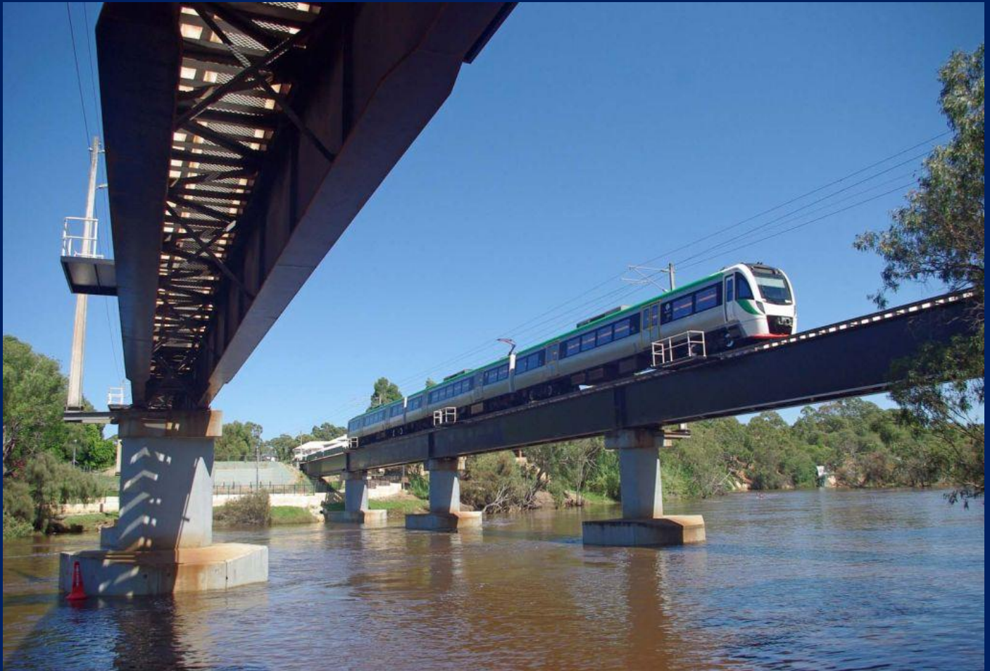
B series EMU crossing flooded Swan River at Guildford February 19th.