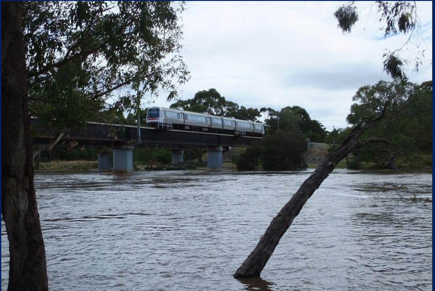
A series EMU crosses flooded Swan River at Guildford February 12th.