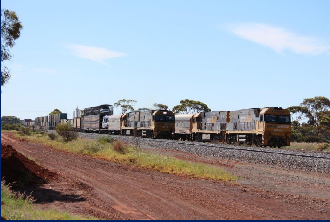
NR76 & NR70 on 6PM6 pass NR79 & NR103 stabled on ballast Parkeston 111/3.