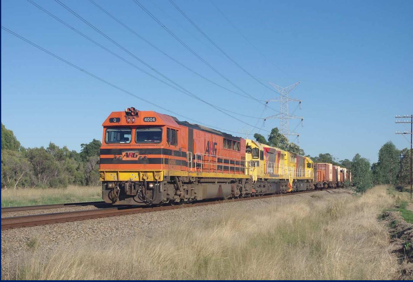
Q4004, LZ3106 & Q4007 on 5426 Aurizon Kalgoorlie Forrestfield freight Middle Swan 24/2.