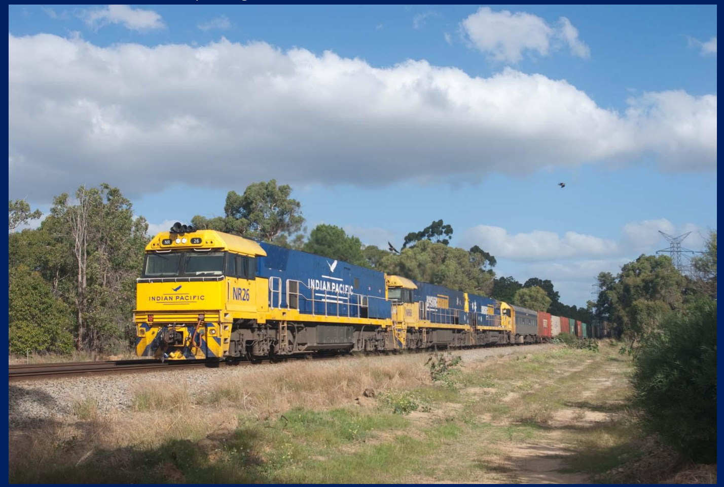
NR26, NR68 & NR112 on 1PM5 Pacific National intermodal Swan View March 26th.