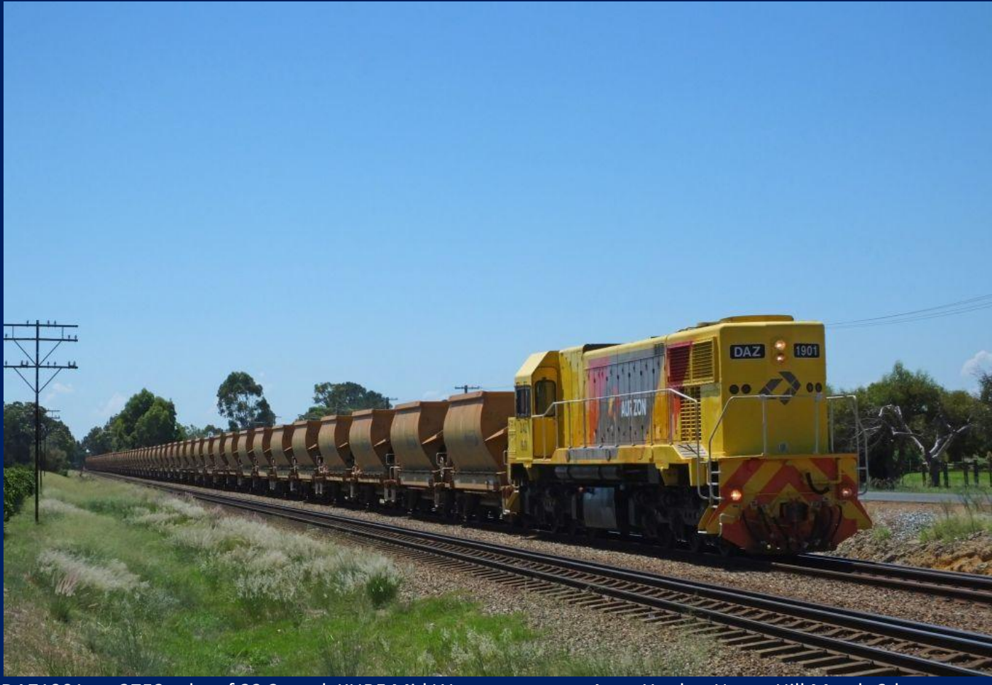
DAZ1901 on 2752 rake of 32 2xpack KHBF Mid West ore cars ex Avon Yard at Herne Hill March 6th.