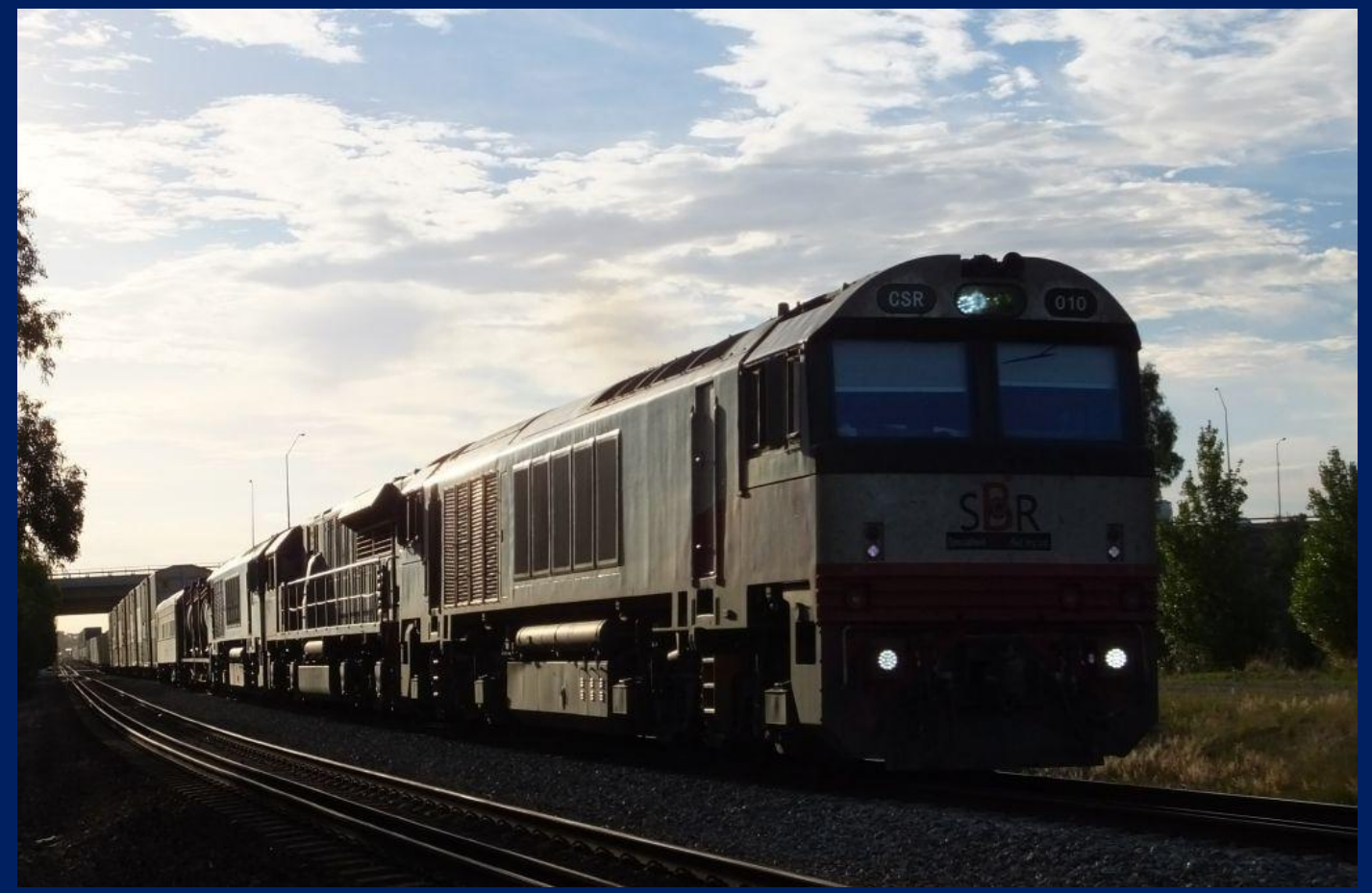
CSR010, SCT007 & CSR003 on very late 2PM9 SCT freight Bellevue March 28th.