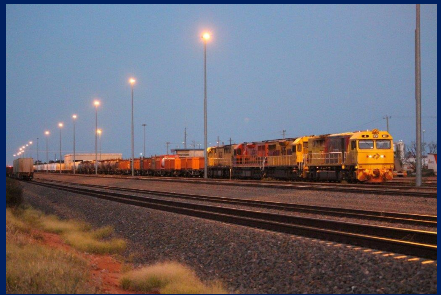
Q4011, LZ3112, [dead attached] LZ3111 & Q4017 on 7426 freight to Forrestfield West Kalgoorlie Yard 4/3.