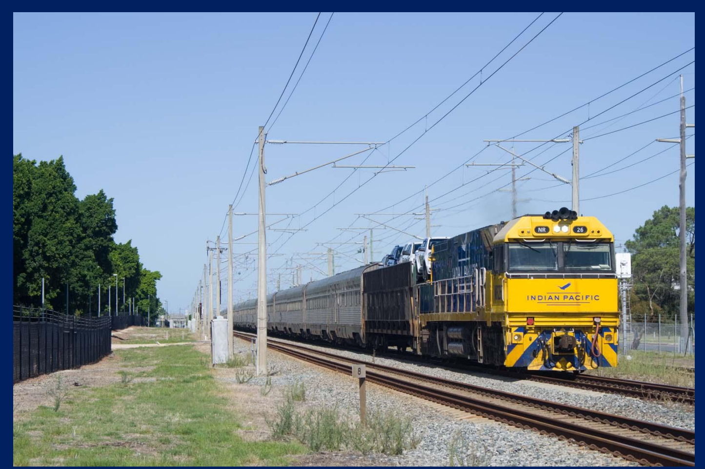
NR26 on 1PA8 Indian Pacific passenger at Bassendean March 19th.