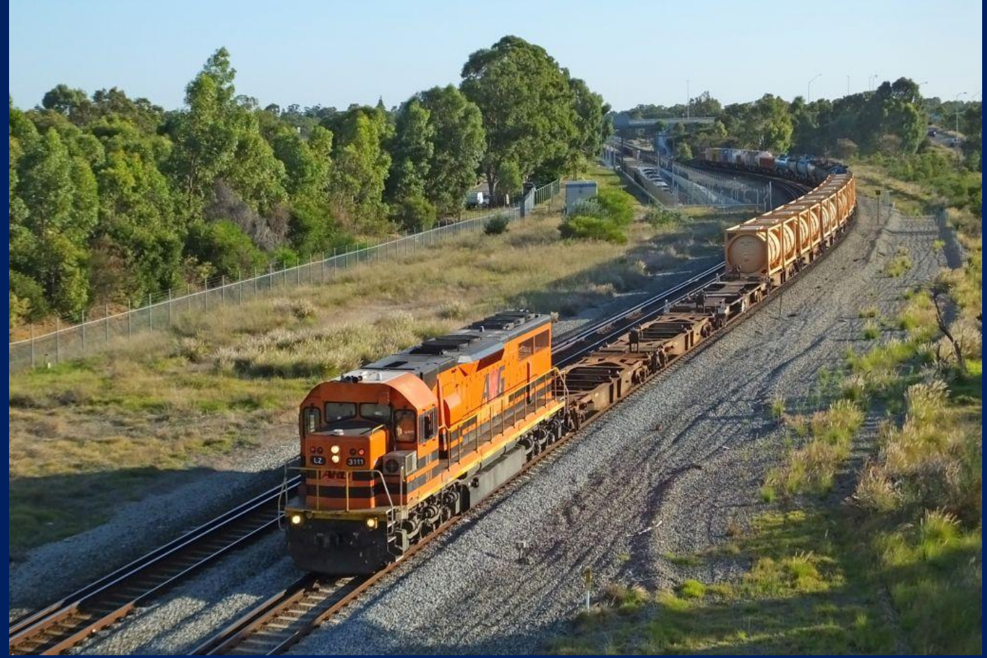
LZ3111 on 4025 Kwinana shunter at Kenwick March 29th.