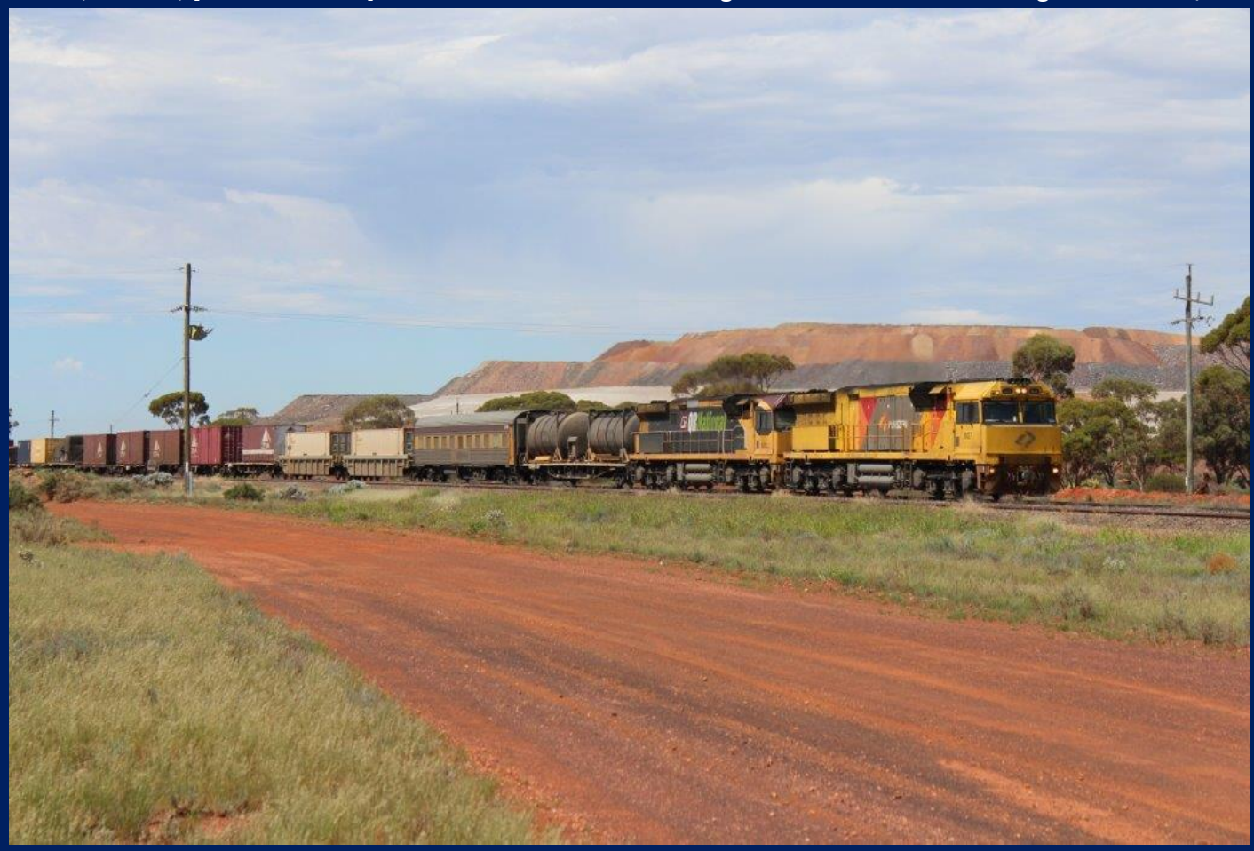
6027 & 6009 on 6MP1 Aurizon intermodal to Perth Parkeston March 5th. Both pho