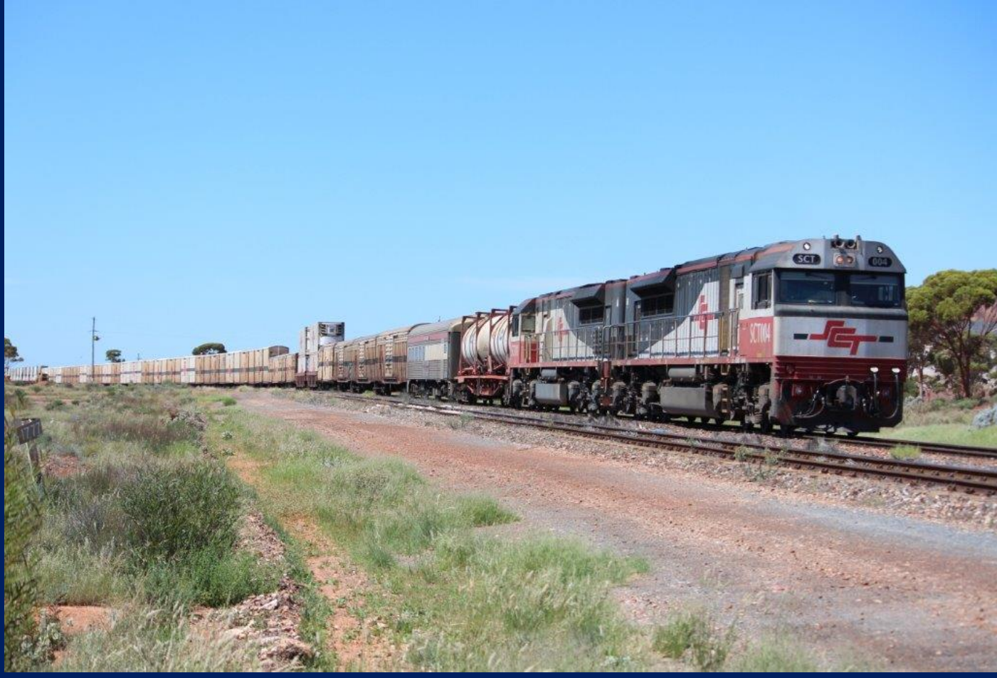
SCT004 & SCT013 on 7PG1 Parkes to Perth freight at Parkeston March 6th.