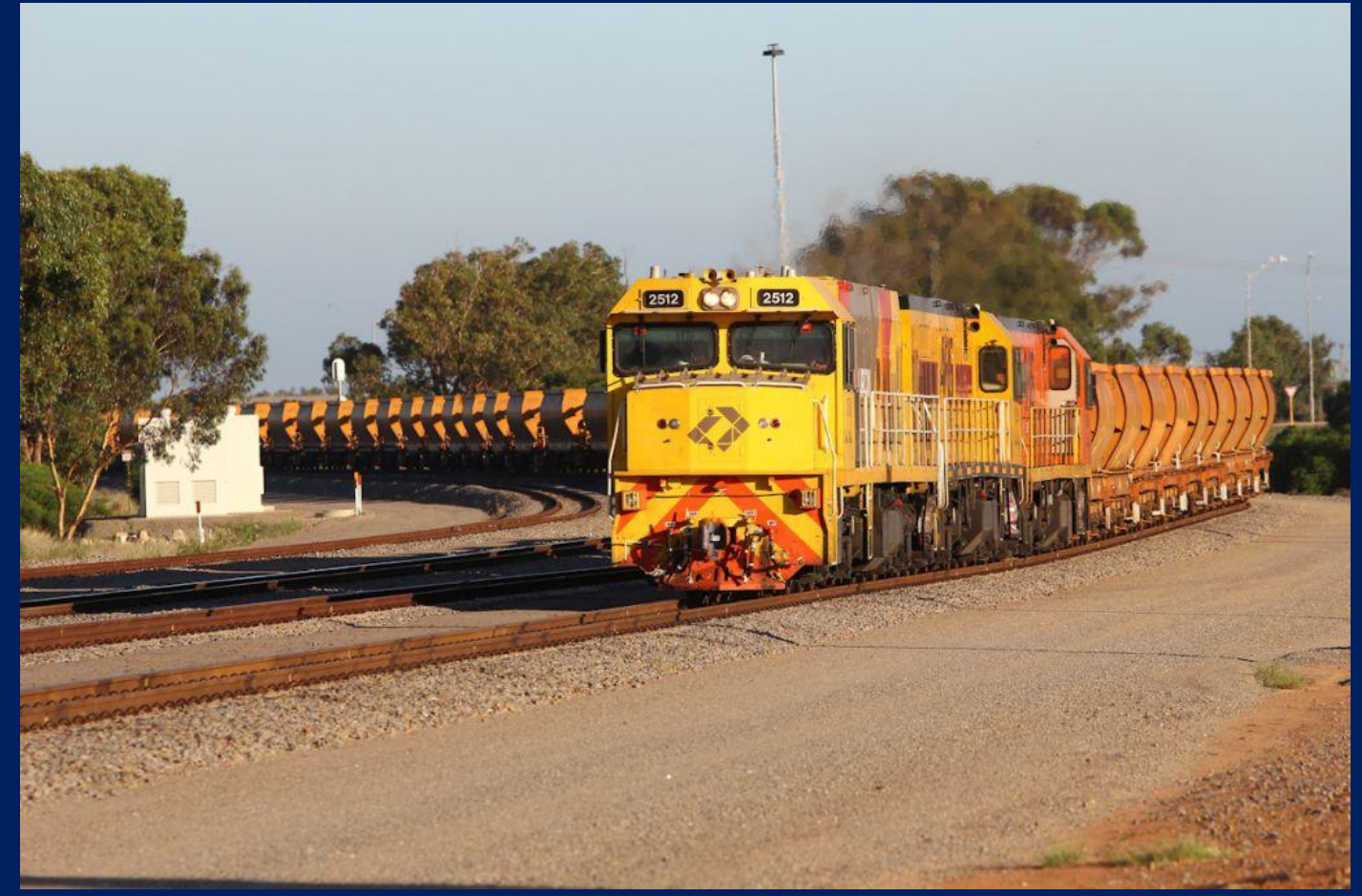
2512, P2508 & P2509 on 2720 empty Mt Gibson ore arriving at Narngulu March 6th.