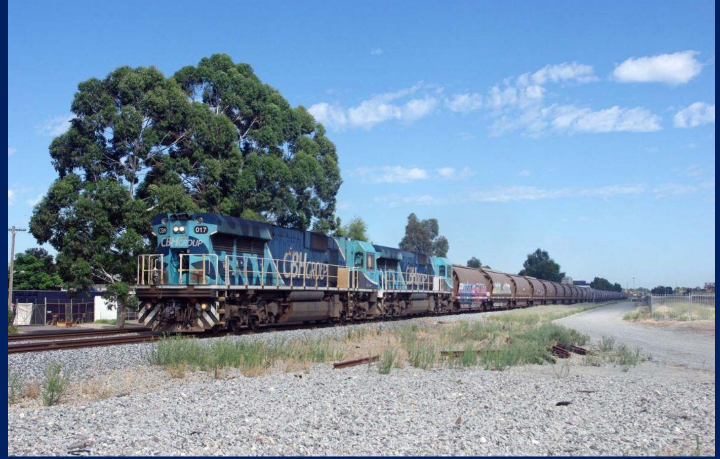
CBH017 & CBH010 on 7K05 empty Watco grain with hired Aurizon XT and CBHN wagons Bellevue 4/3.