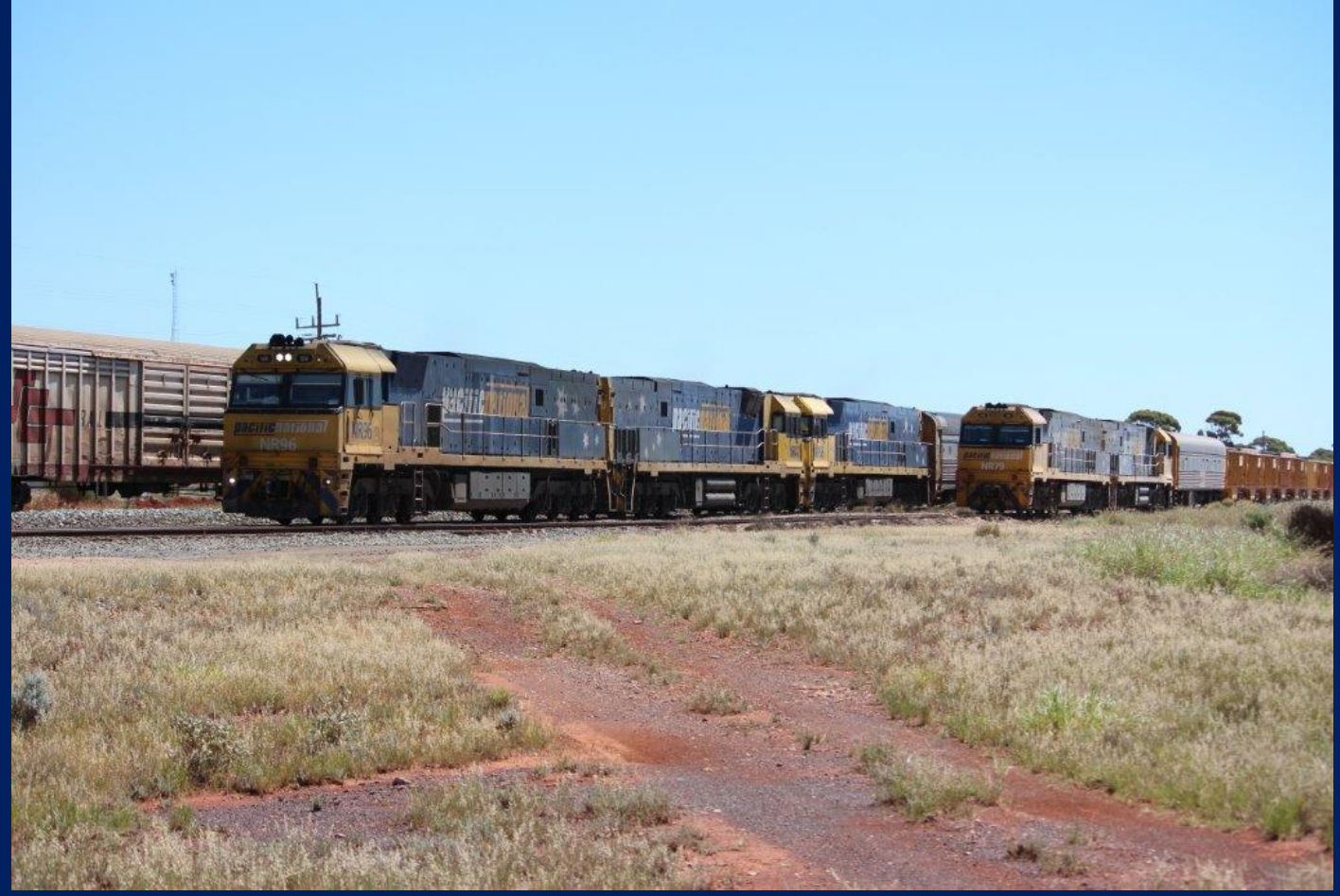
NR96, NR 47 & NR58 on 6PM7 passing NR79 & NR103 on ballast Parkeston 11/3.