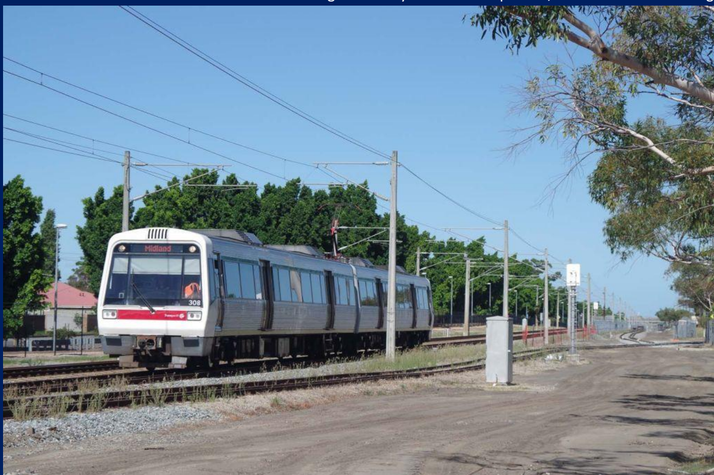
A series EMU 308 showing new PTA track works storage siding at Bassendean 19/3.