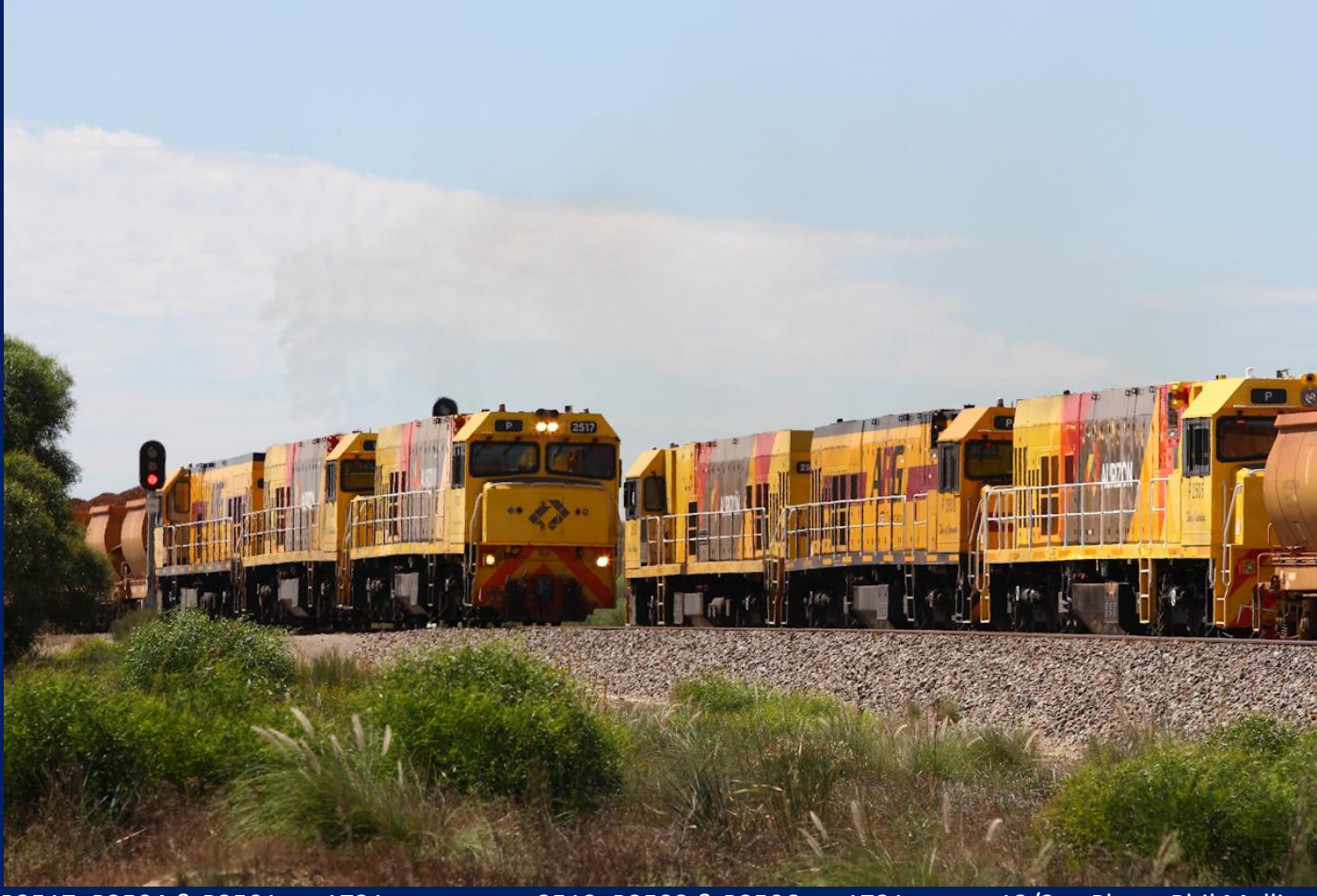
P2517, P2504 & P2501 on 1721 ore crosses 2512, P2508 & P2506 on 1721 empty 12/3.