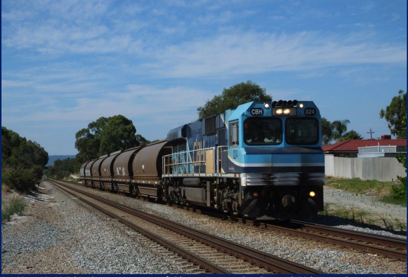
CBH024 on 2K02 6xhired XT wagons Forrestfield to Kwinana at Thornlie March 20th.