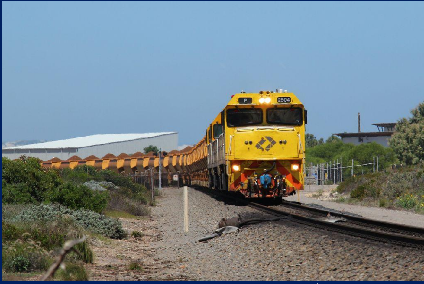
P2504, P2501 & P2502 on 4721 Mt Gibson Perenjori ore to port at Beachlands 1/3.