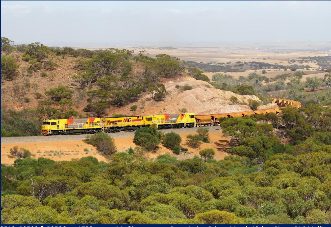
2512, P2508 & P2506 on 1720 empty Mt Gibson ore to Perenjori at Bringo March 12th.