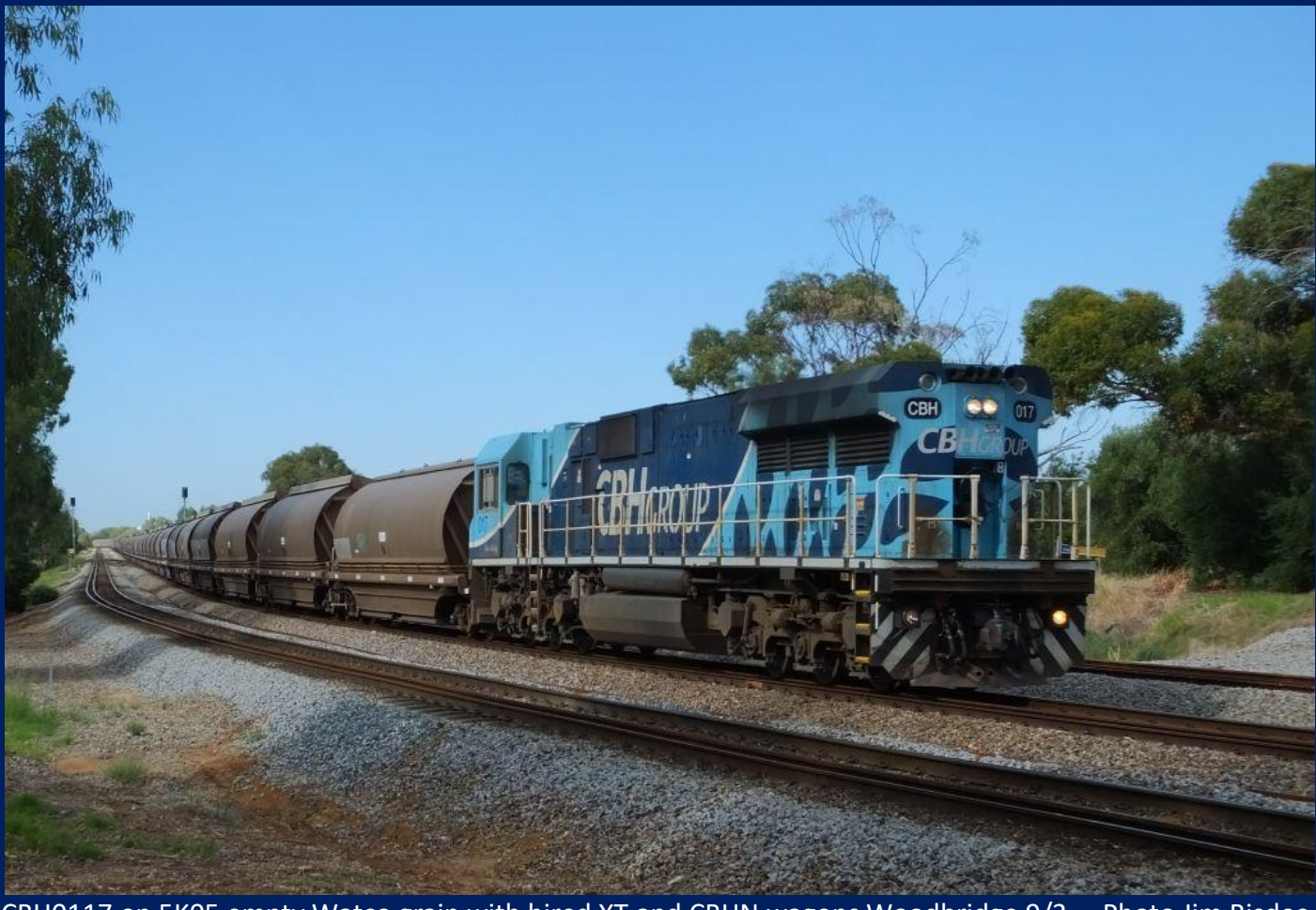
CBH0117 on 5K05 empty Watco grain with hired XT and CBHN wagons Woodbridge 9/3.