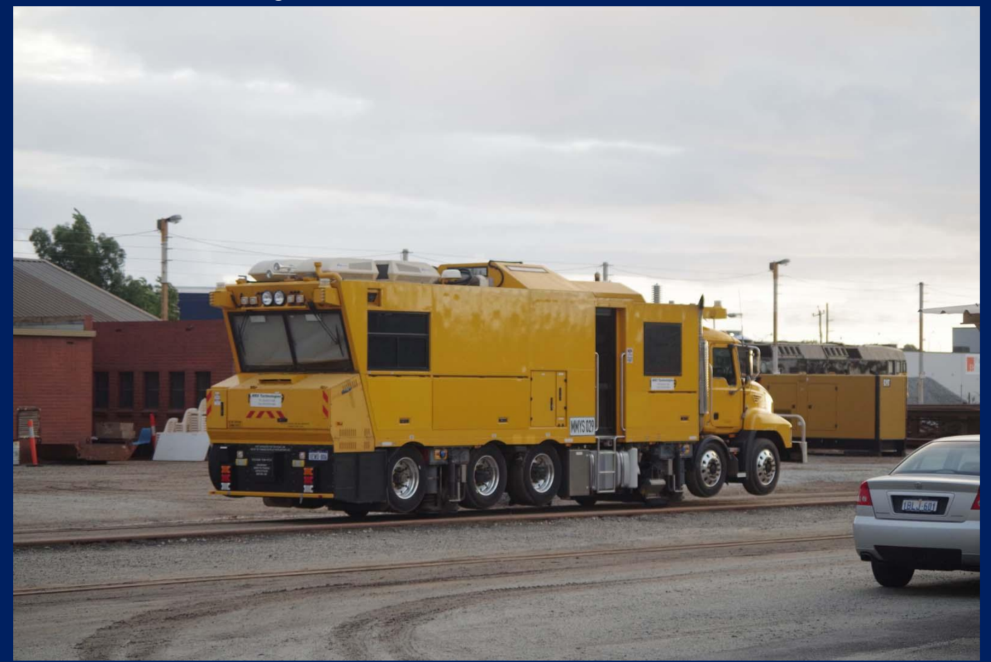
MMYS029 track recording road rail vehicle at Midland March 22nd