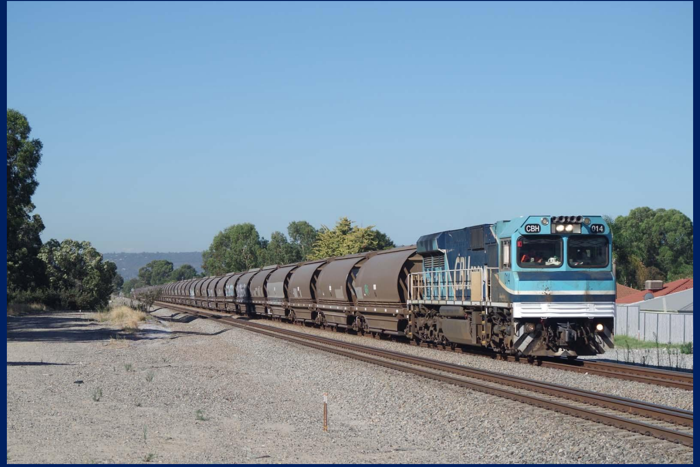
CBH014 on 2K02 transfer of hired Aurizon XT grain hoppers Forrestfield to CBH Kwinana at Thornlie 27/2.