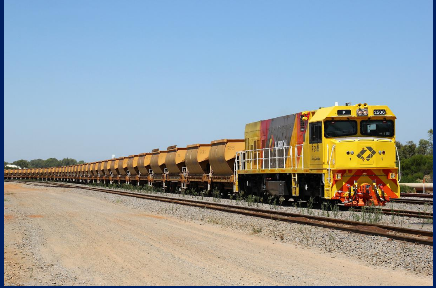
P2506 on rake of Mid West KHBF ore cars at Narngulu March 10th.