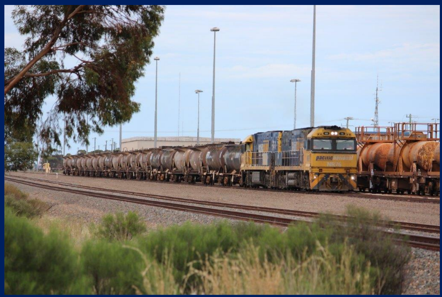
NR76 & NR56 on 4445 19 empty Shell tankers to Esperance at WEK March 22nd. Phot