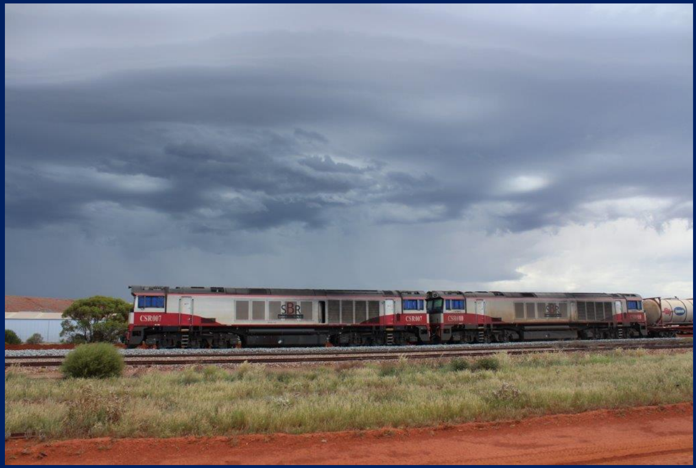
CSR007 & CSR010 on 6PM9 SCT freight arriving Parkeston under stormy skies 10/3.