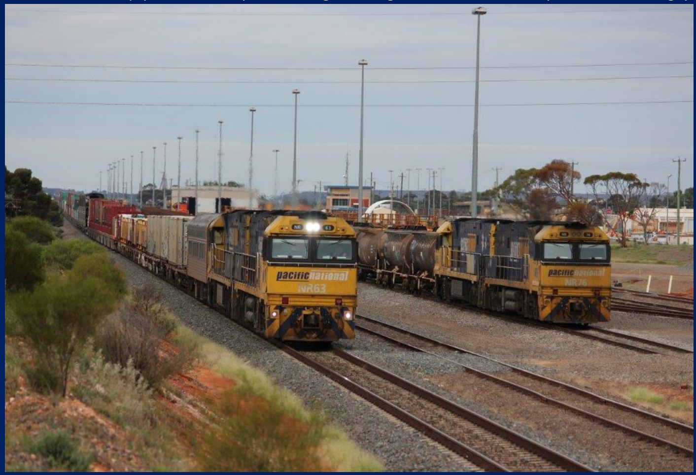
NR63 & NR16 on 5MP2 combined with NR76 & NR56 on Esperance fuel in West Kalgoorlie Yard 24/3.