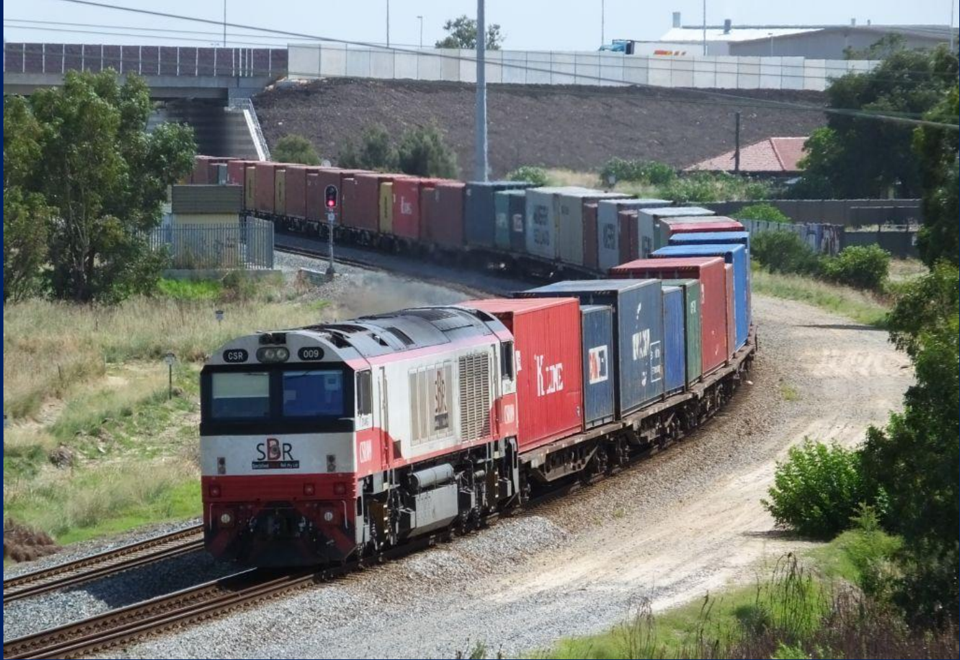
CSR009 on 4142 port shuttle at Wattle Grove March 15th.