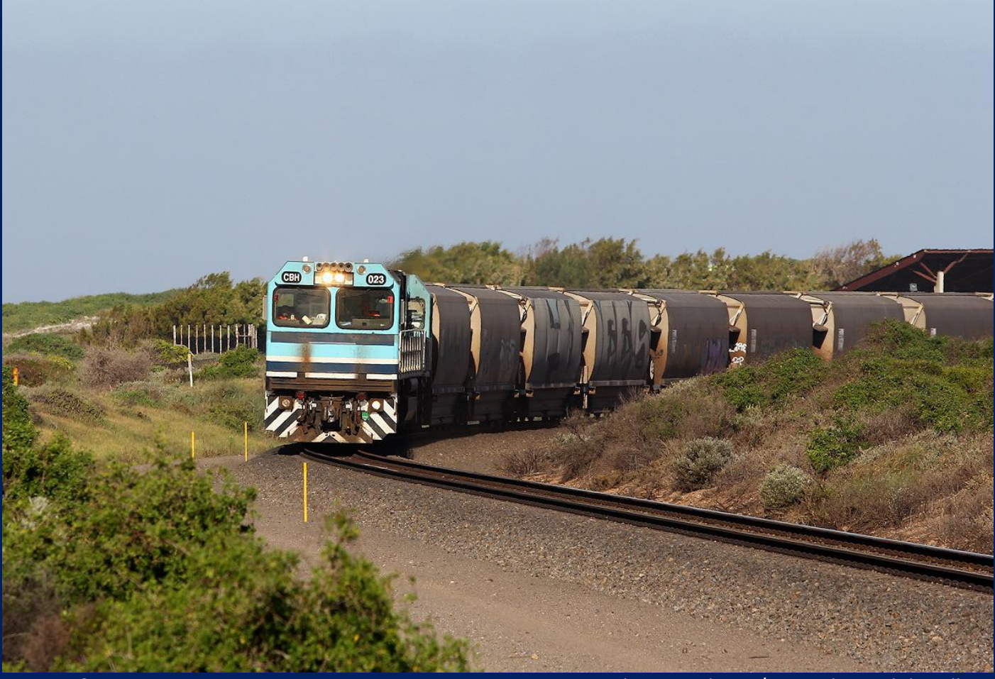
CBH023 & CBH009 on 2G50 empty Watco grain to Mingenew at Mahomets Flats 6/3.