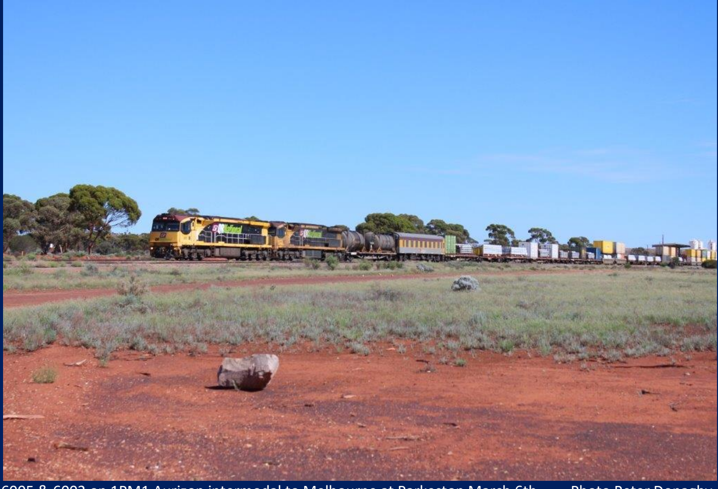
6005 & 6002 on 1PM1 Aurizon intermodal to Melbourne at Parkeston March 6th.