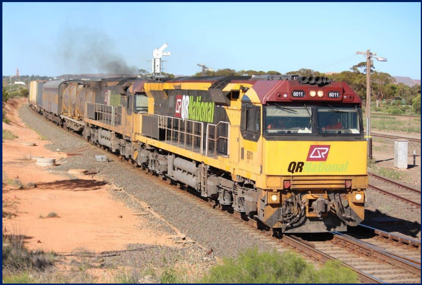
6011 & 6010 on late 3MP1 Aurizon intermodal entering West Kalgoorlie 23/2.