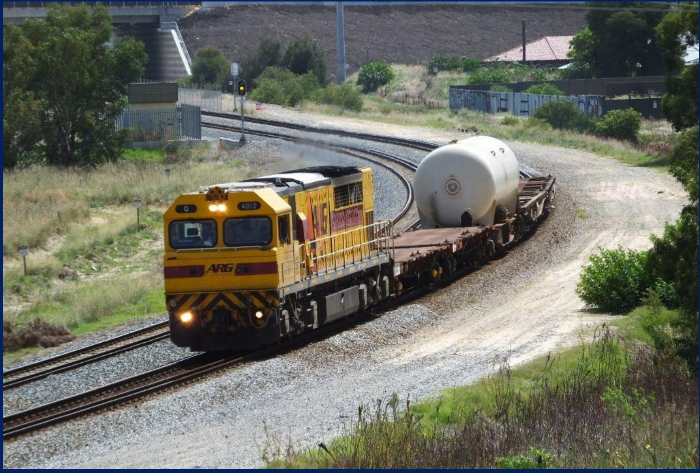
Q4012 on 2430 empty sulphur with few empty wagons and ammonia tanker Wattle Grove March 15th.