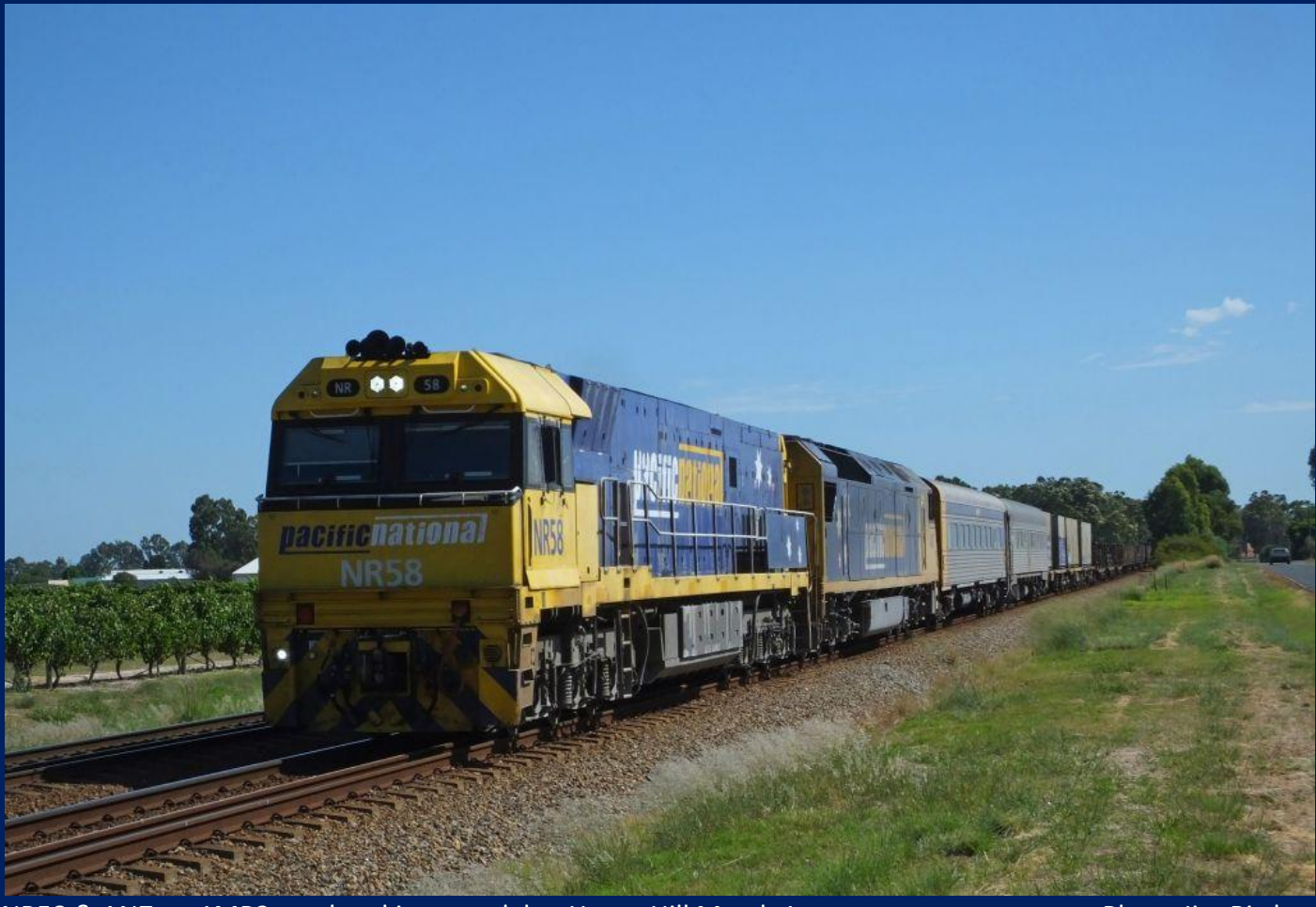
NR58 & AN7 on 1MP2 steel and intermodal at Herne Hill March 1st.