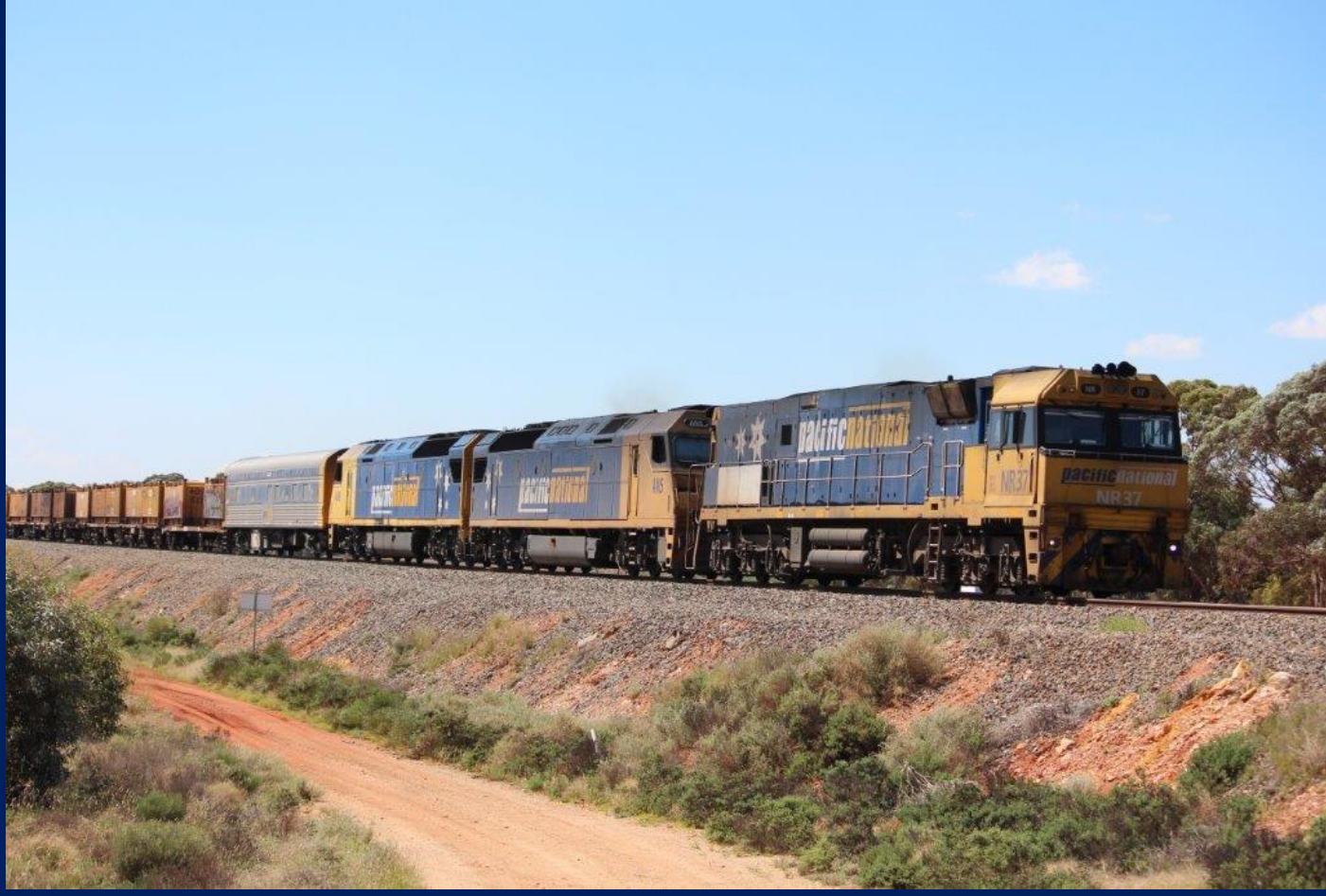
NR37, AN5 & AN9 on 5MP2 combined steel intermodal Binduli March 26th.