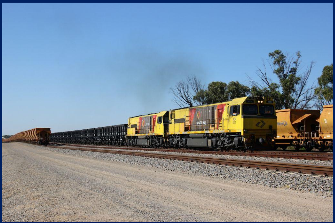
ACN4151 & ACN5148 on 7761 Karara ore at Narngulu on way to Geraldton port 25/3.