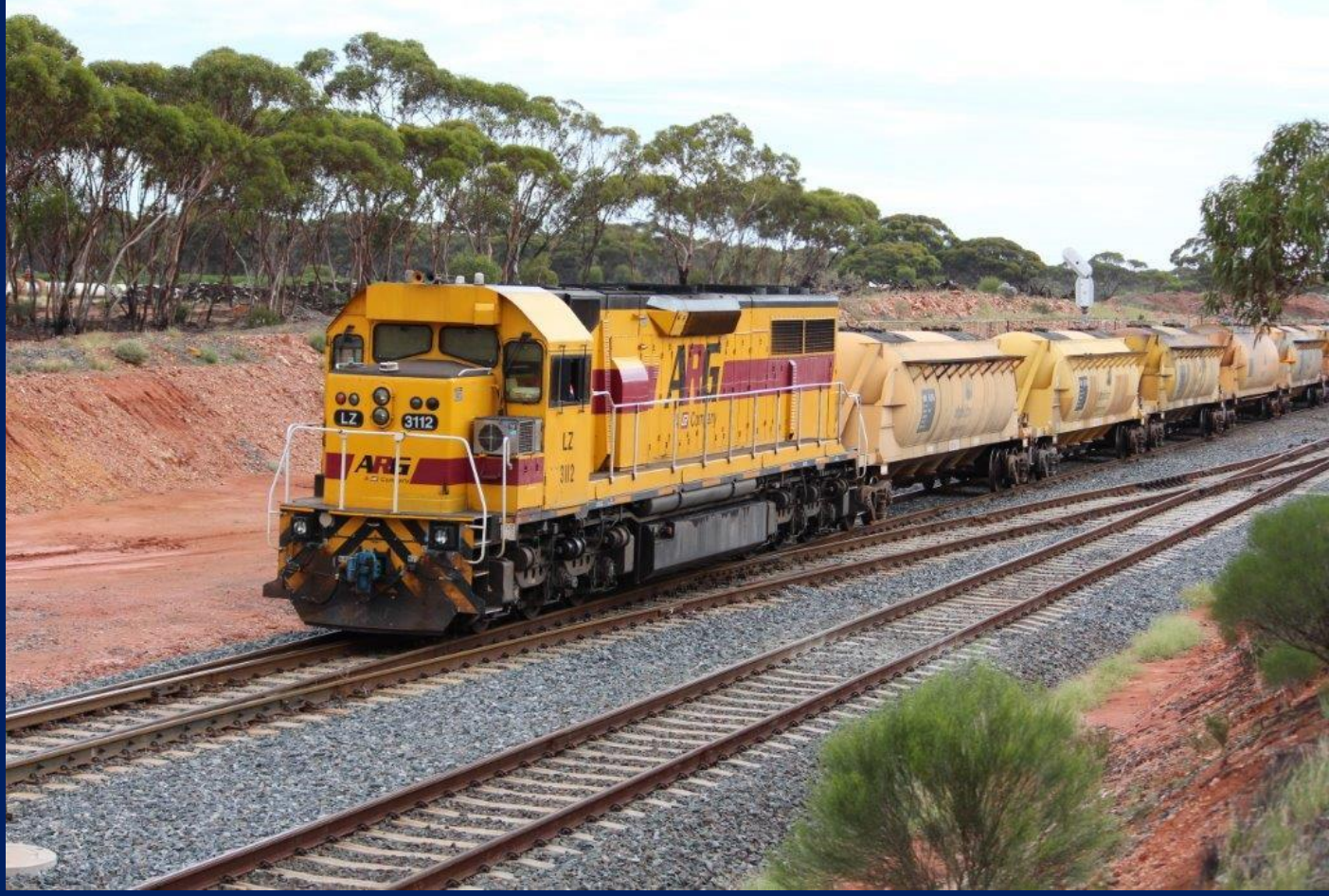
LZ3112 on 6438 empty nickel ex Hampton entering west Kalgoorlie Yard 24/3.