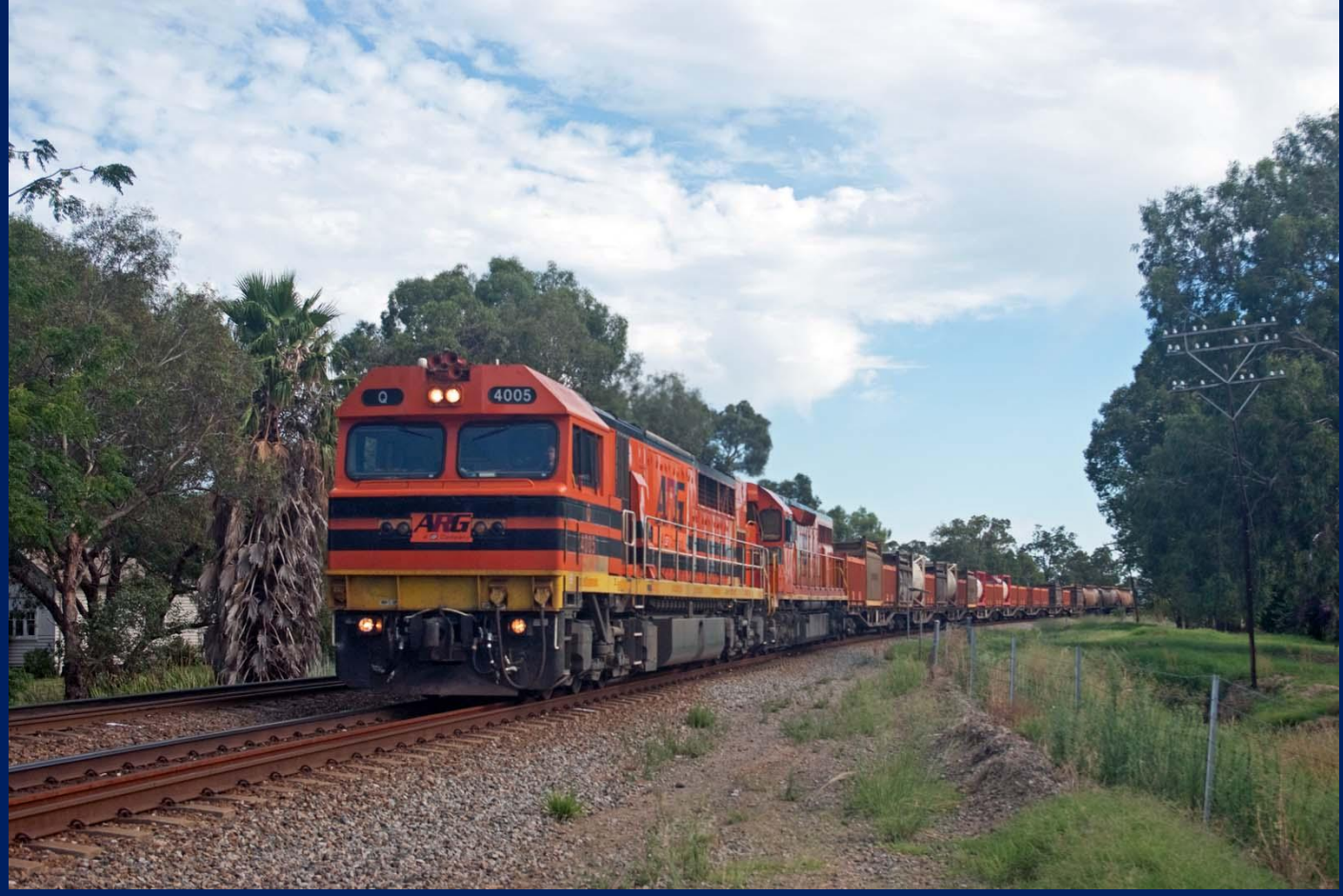
Q4005 & LZ3114 on 4426 freight to Forrestfield Swan View March 9th.