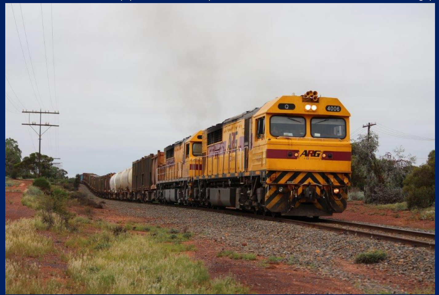
Q4006 & Q on 6029 sulphur departing Kalgoorlie March 11th.