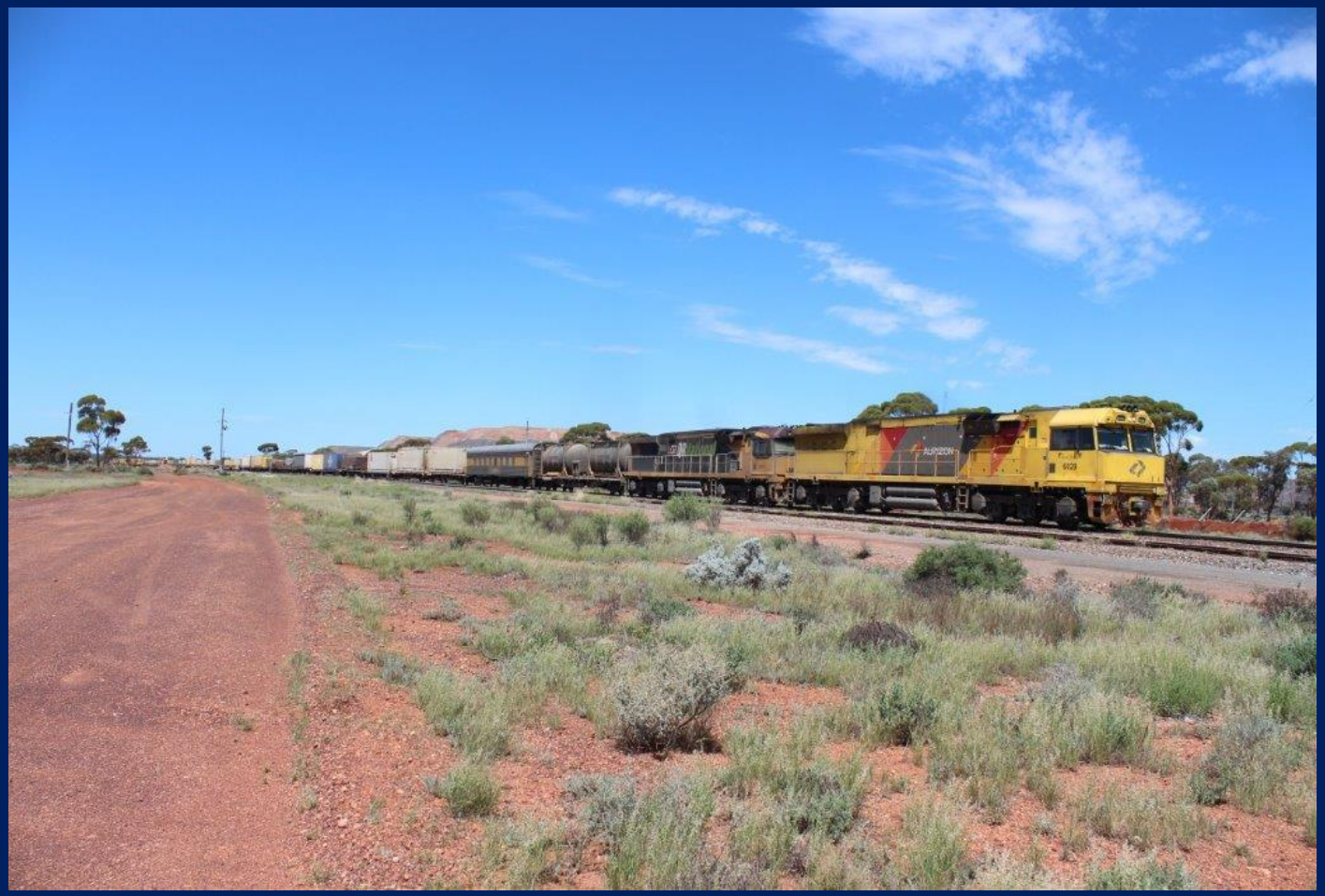
6029 & 6010 on 7MP1 Aurizon intermodal at Parkeston March 6th.