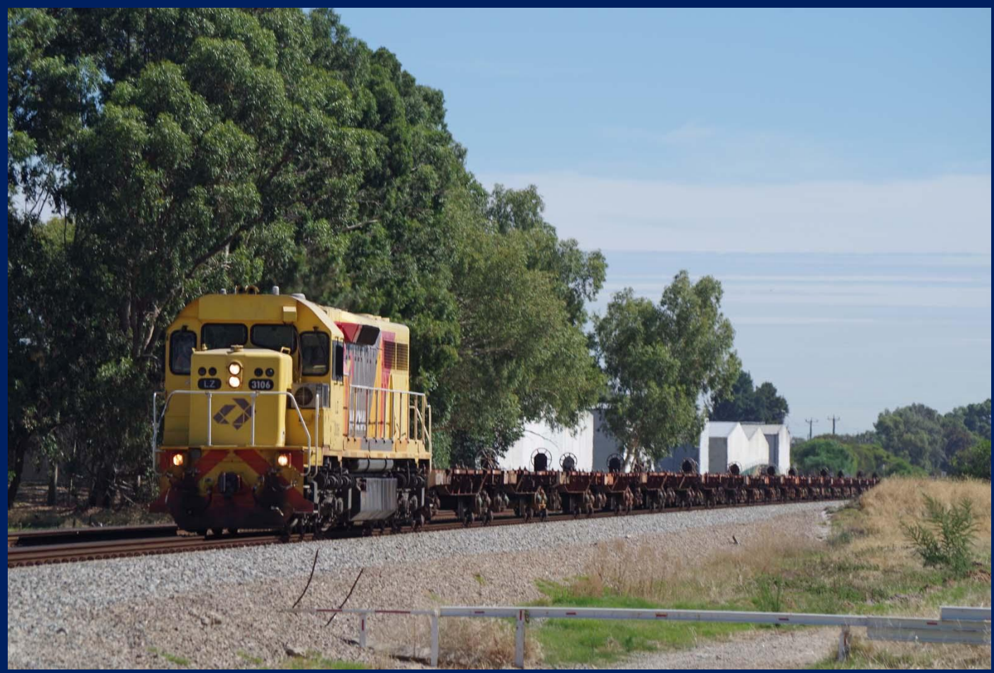
LZ3106 on 2195 empty container flats at Canning Vale February 27th.