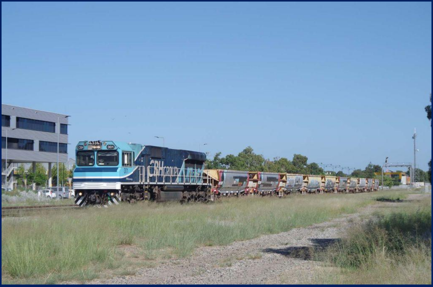
CBH001 on 5BT1 empty narrow gauge ballast train at Midland March 16th. Both photos