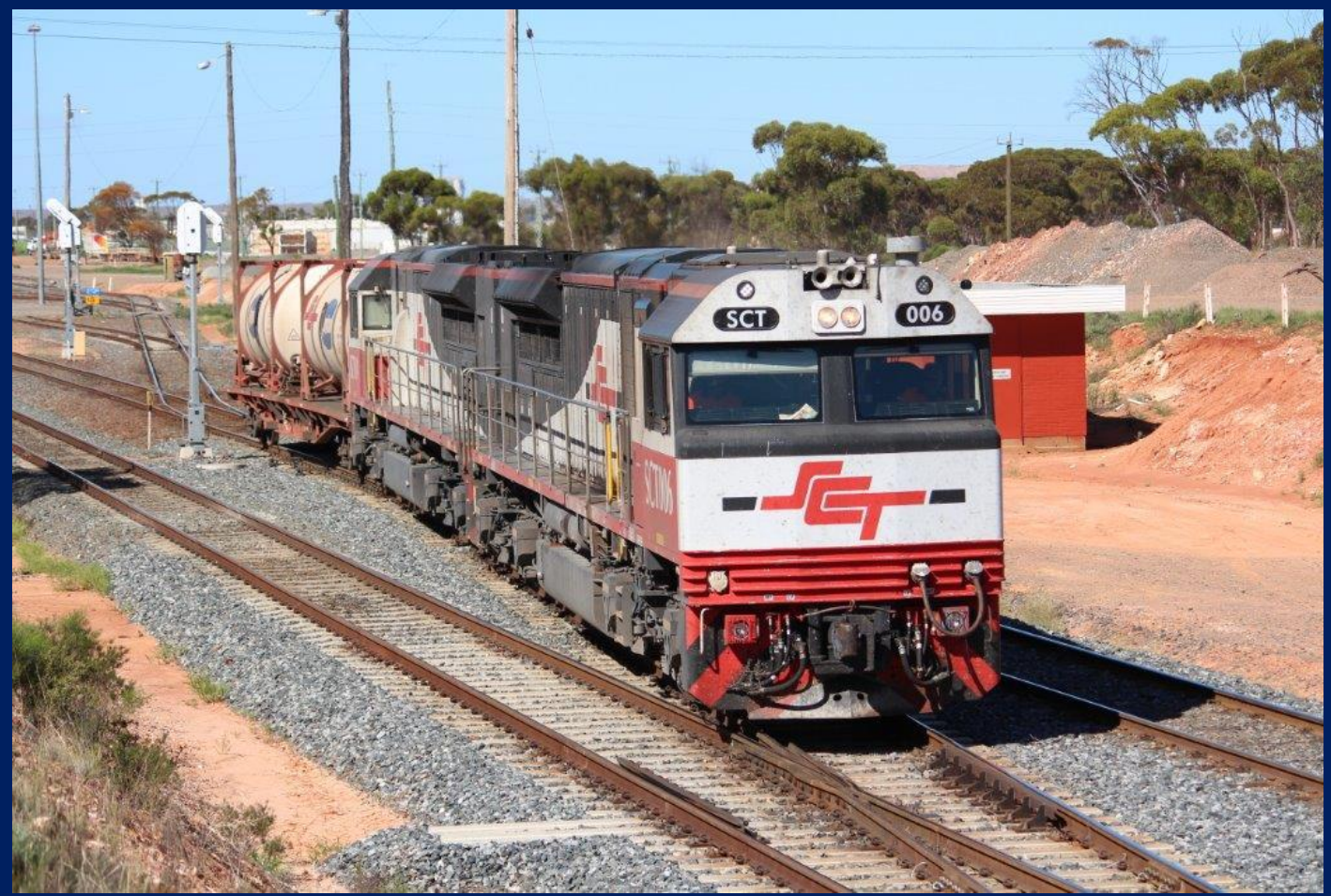
SCT006 & SCT014 on 3MP9 shunt off its inline fuel pod at West Kalgoorlie 23/2 to be collected by 4PM9.