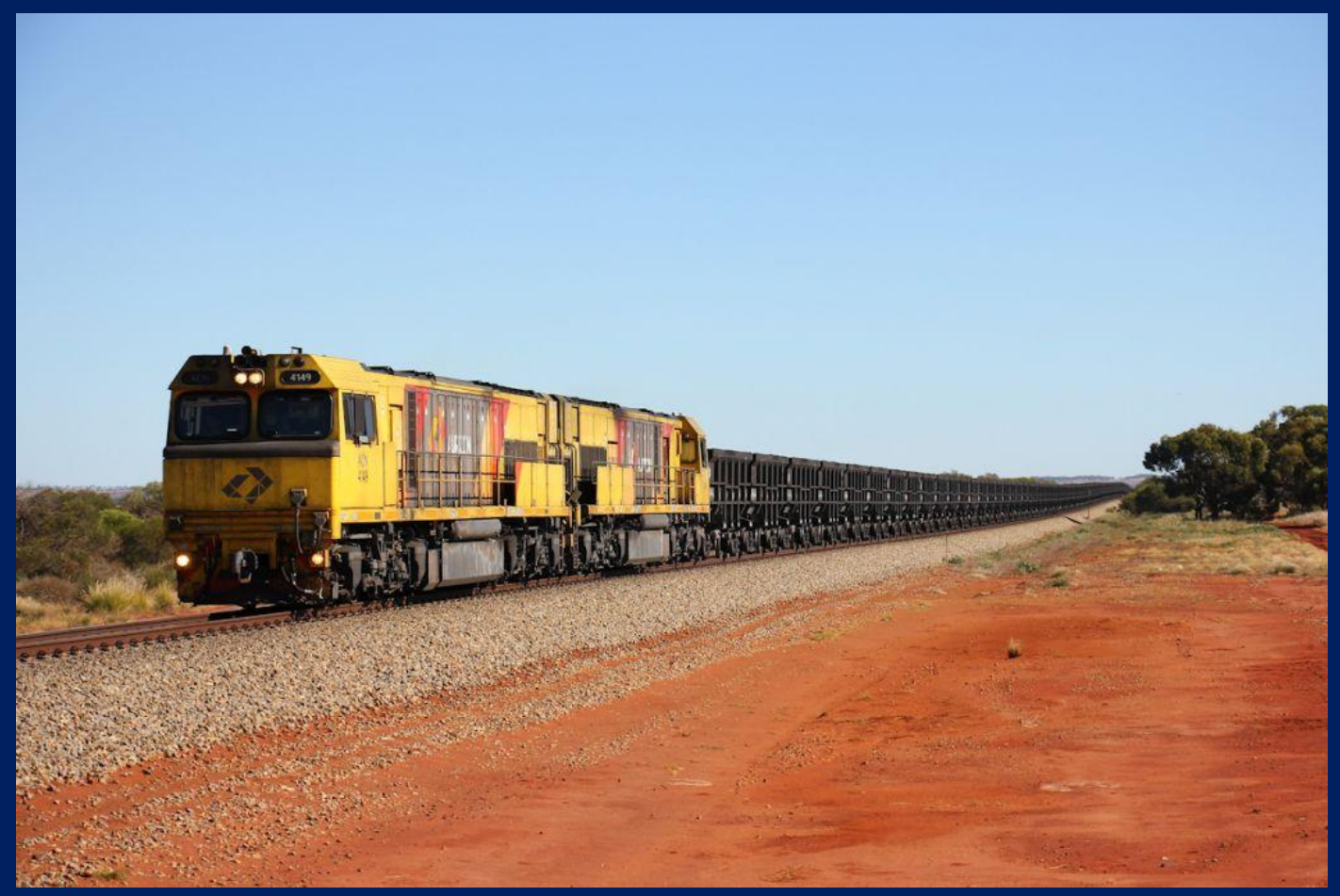
ACN4149 & ACN4146 on 1762 empty ore to Karara near Tenindewa May 28th.