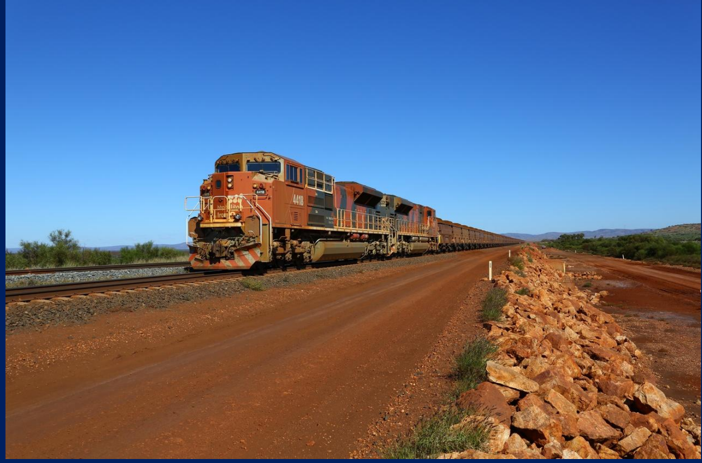
4418 & 4374 run loaded ore cross Fortescue River at Cowra May 29th.