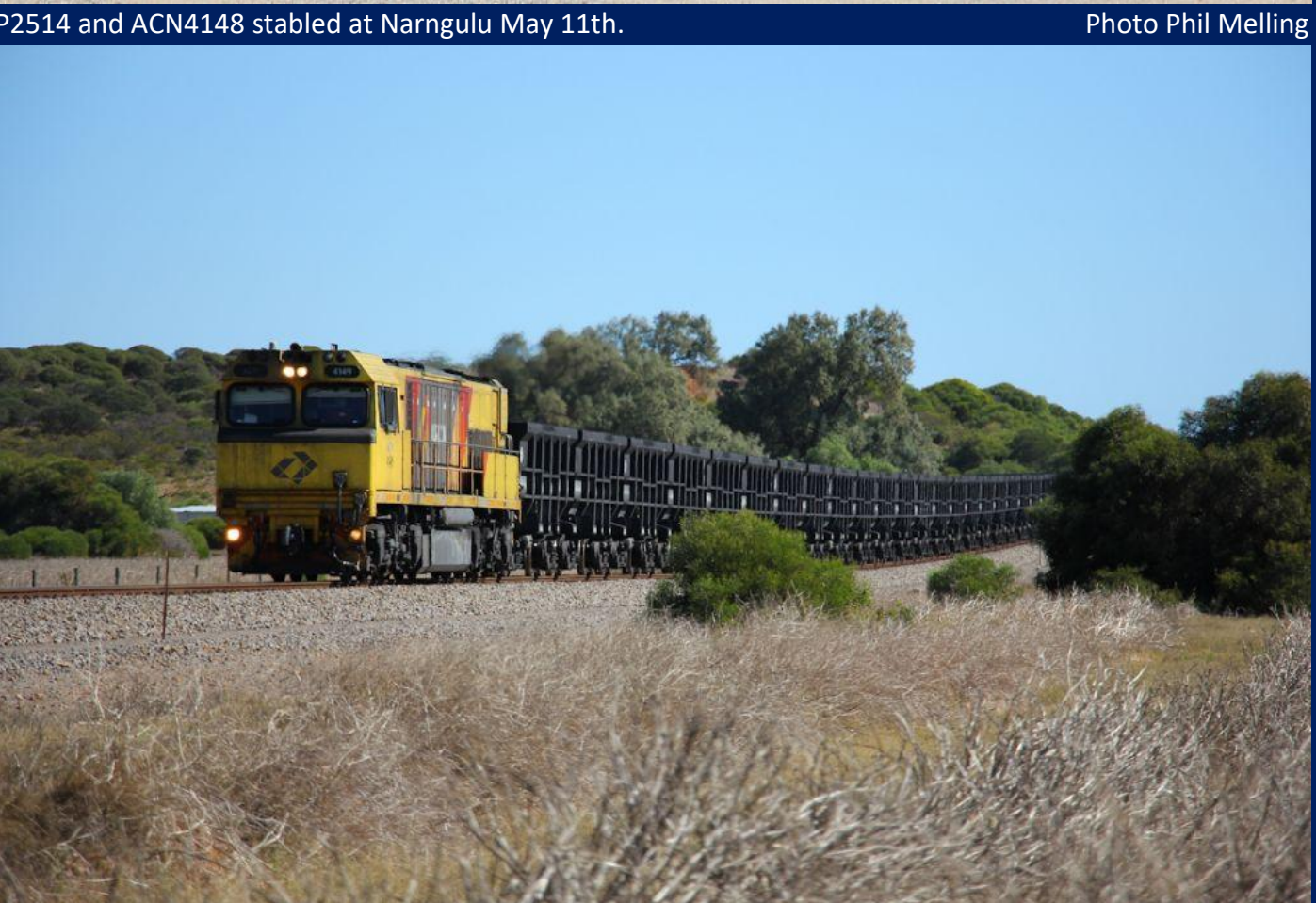
ACN4149 on empty Karara ore near Karloo May 24th.