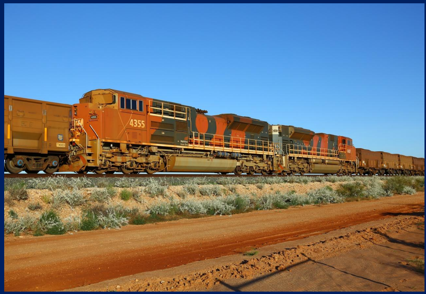
4355 & 4427 mid train DPU units on loaded entering Mooka May 29th.