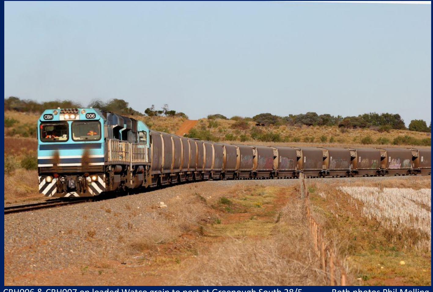
CBH006 & CBH007 on loaded Watco grain to port at Greenough South 28/5.