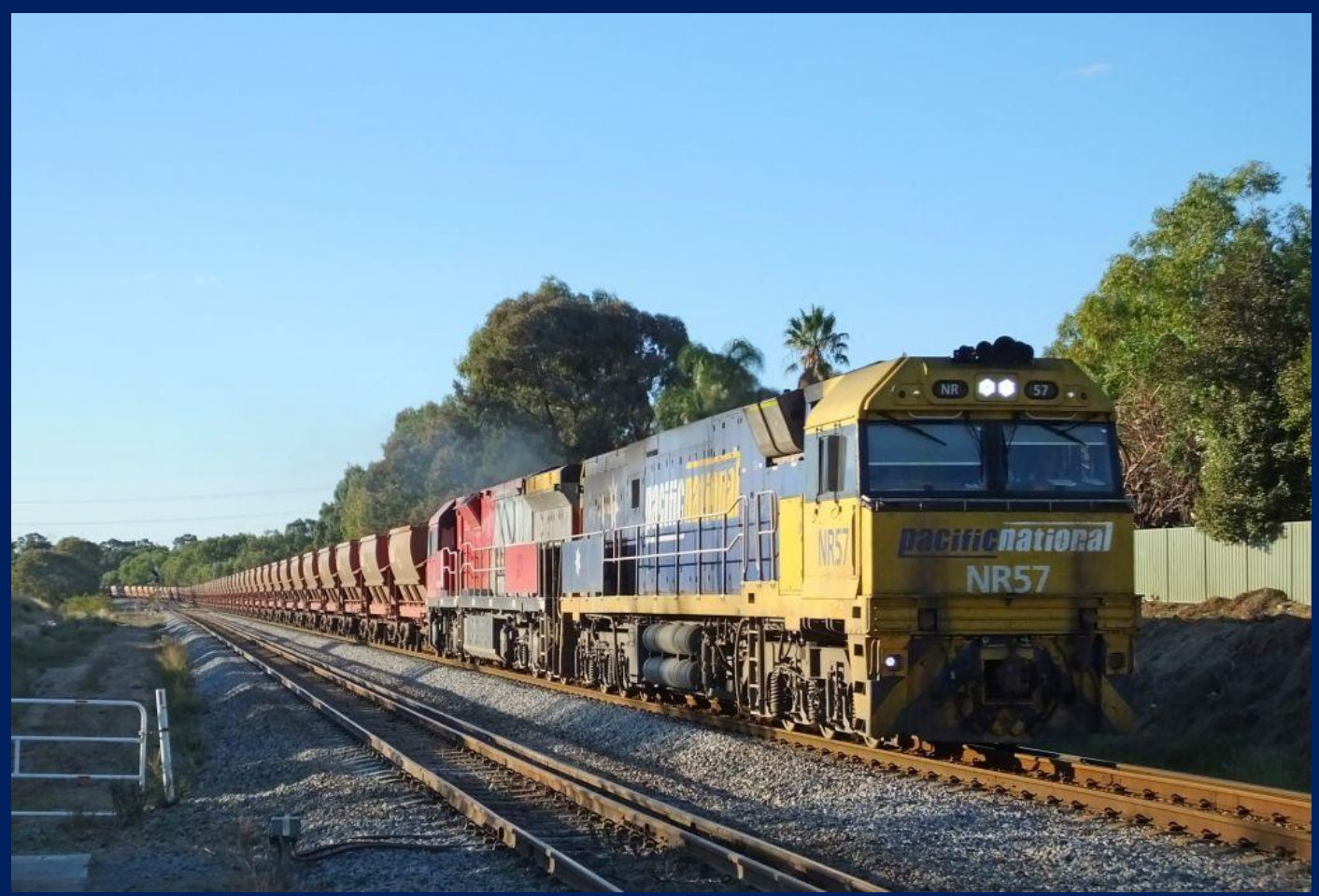
NR57 & MRL002 on 1030 Polaris ore to KBT Kwinana, Hazelmere May 28th.