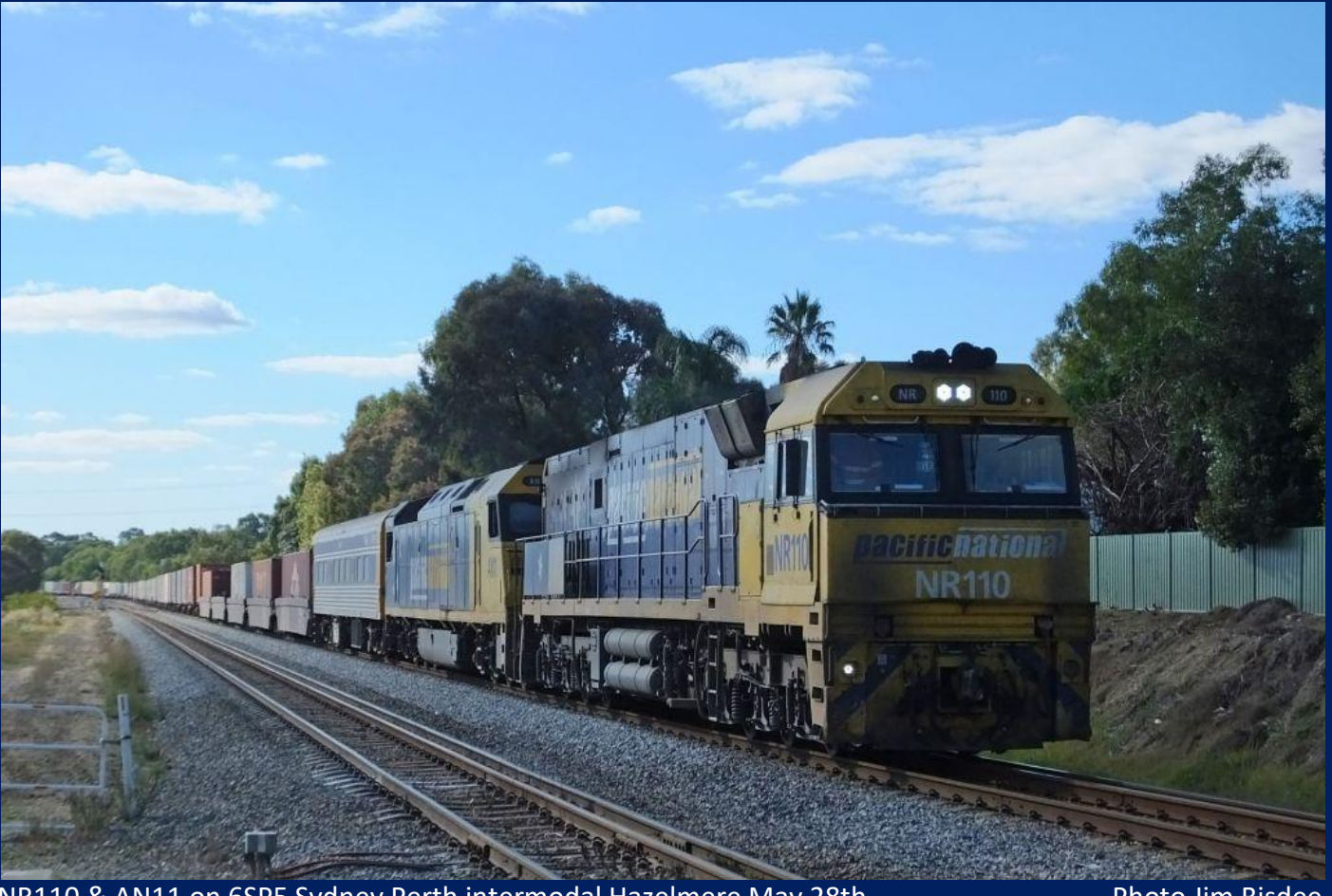
NR110 & AN11 on 6SP5 Sydney Perth intermodal Hazelmere May 28th.