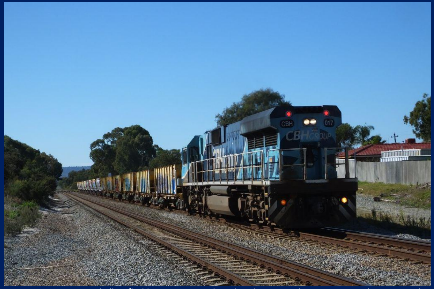
CBH017 on 2BT2 empty ballast flashbutt to Brunswick at Thornlie May 29th.