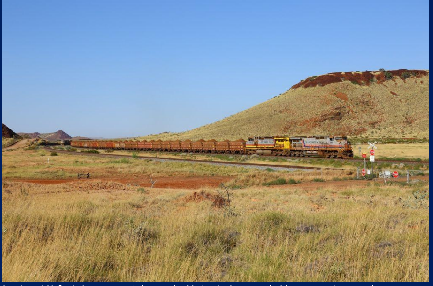
C44-9W 7069 & 7053 on east main bypass disabled train Green Pool 13/5.