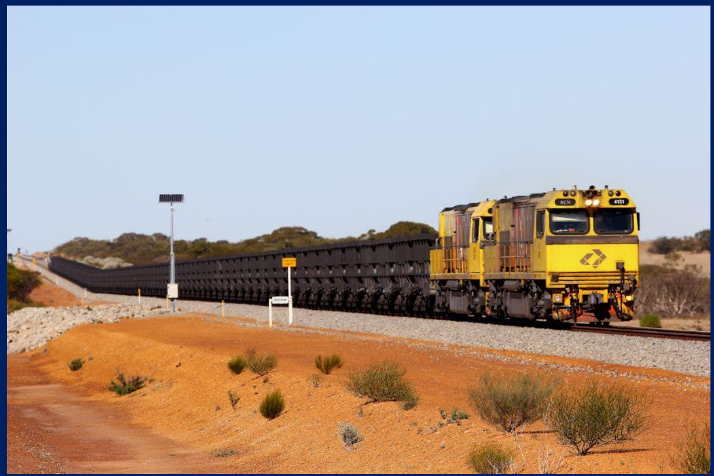
ACN4151 & ACN4168 DPU 4141 on Karara ore climbing thru Wilroy May 28th.