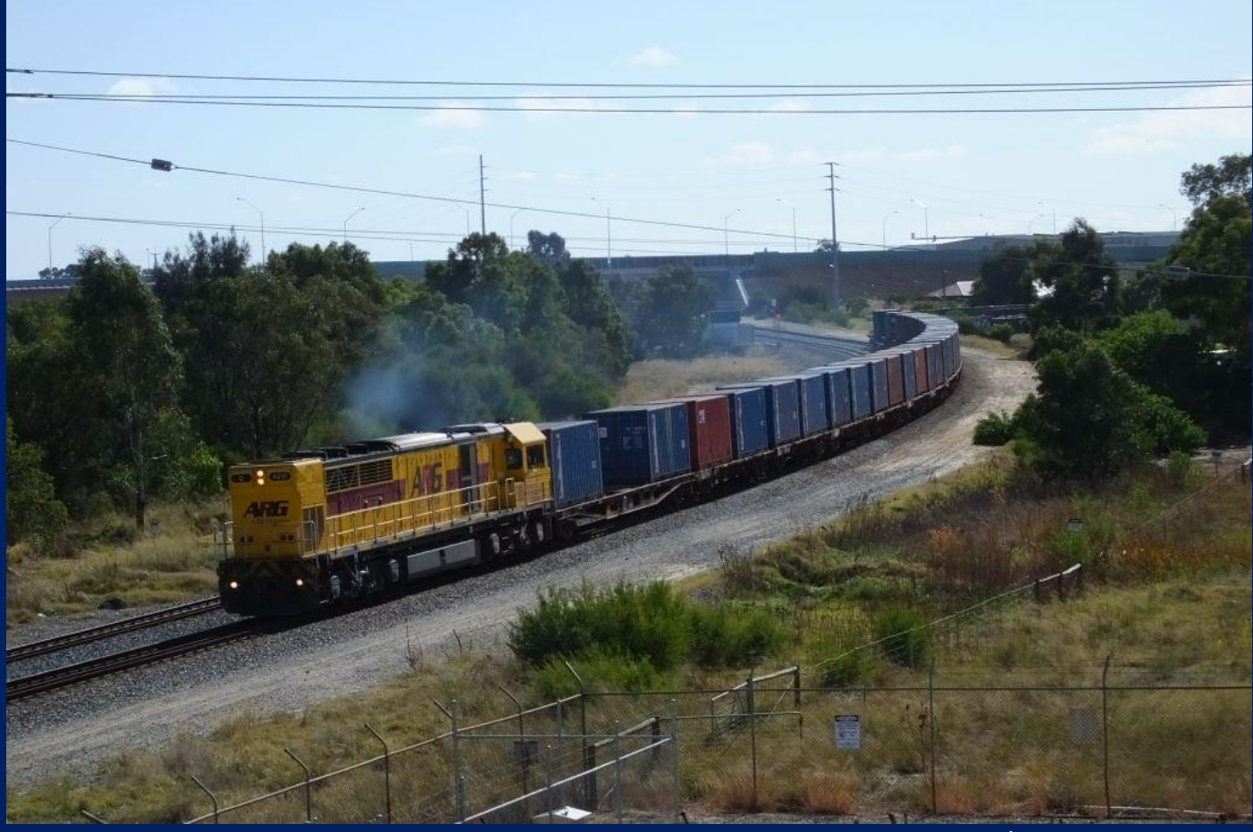
Q4010 on 4196 rare earths container train Forrestfield to North Port, Wattle Grove 17/5.