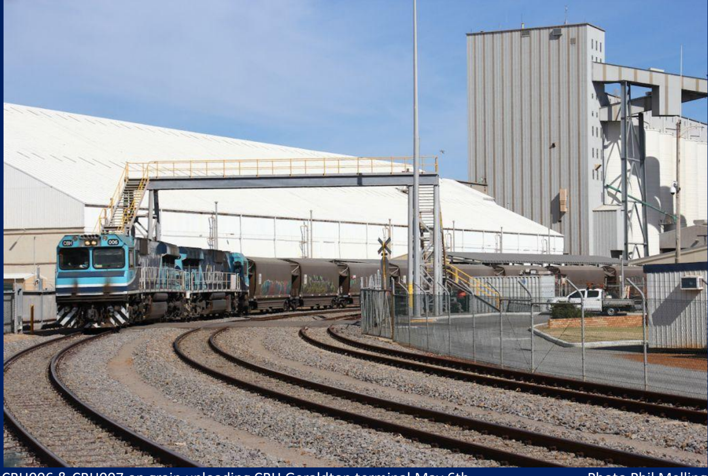
CBH006 & CBH007 on grain unloading CBH Geraldton terminal May 6th.