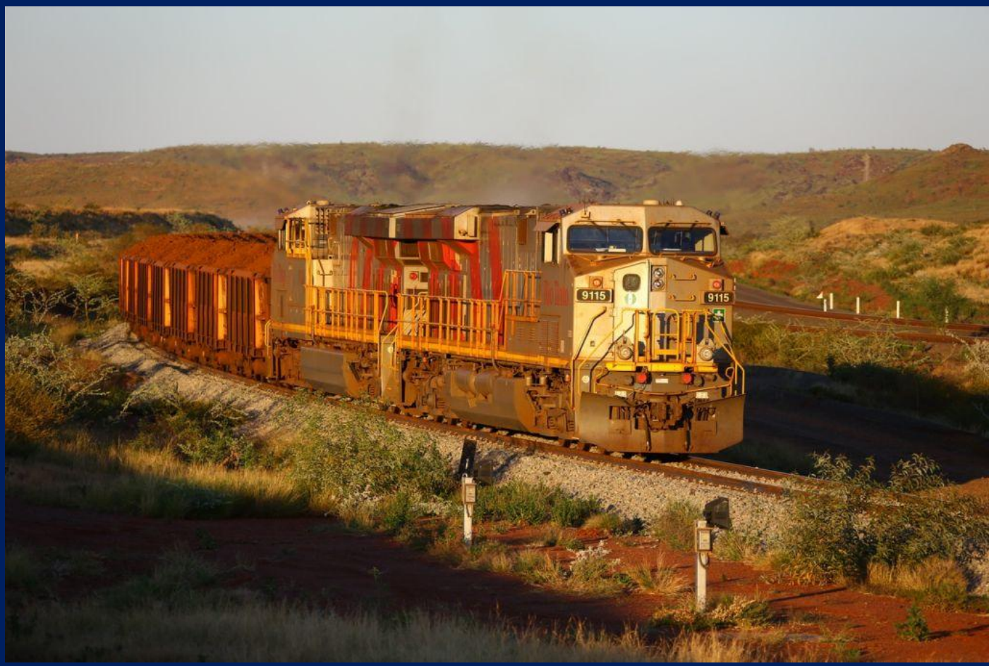
ES44ACi 9115 & 9103 enter Cape Lambert South Yard with loaded "J Train" ore from Deepdale May 13th. Photo Toad Montgomery

Publisher: Jim Bisdee Email: pm1225@bigpond.com Copyright Jim Bisdee © 2017