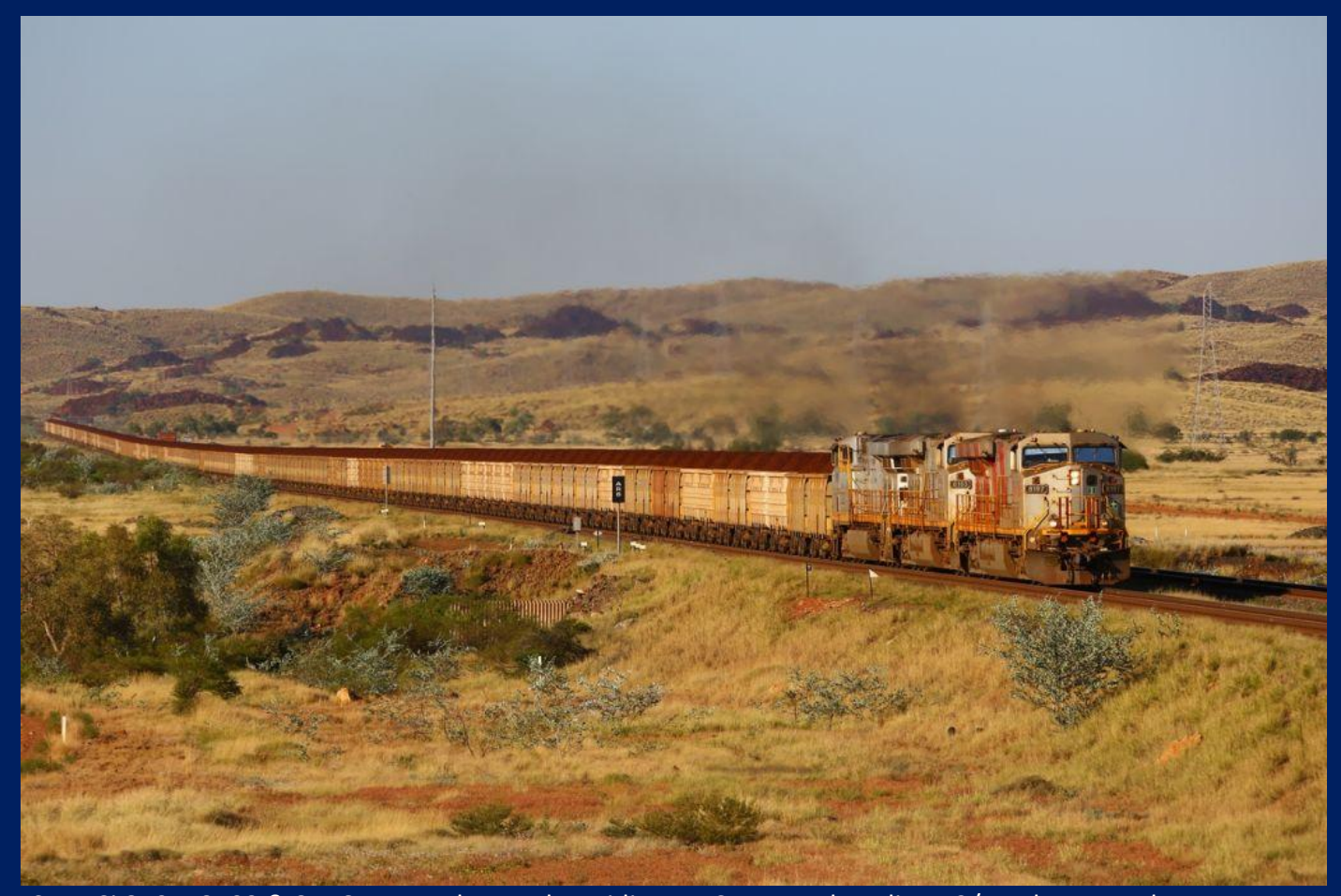
ES44DCi 8197, 8103 & 8116 power thru Arches siding on Cape Lambert line 13/5.