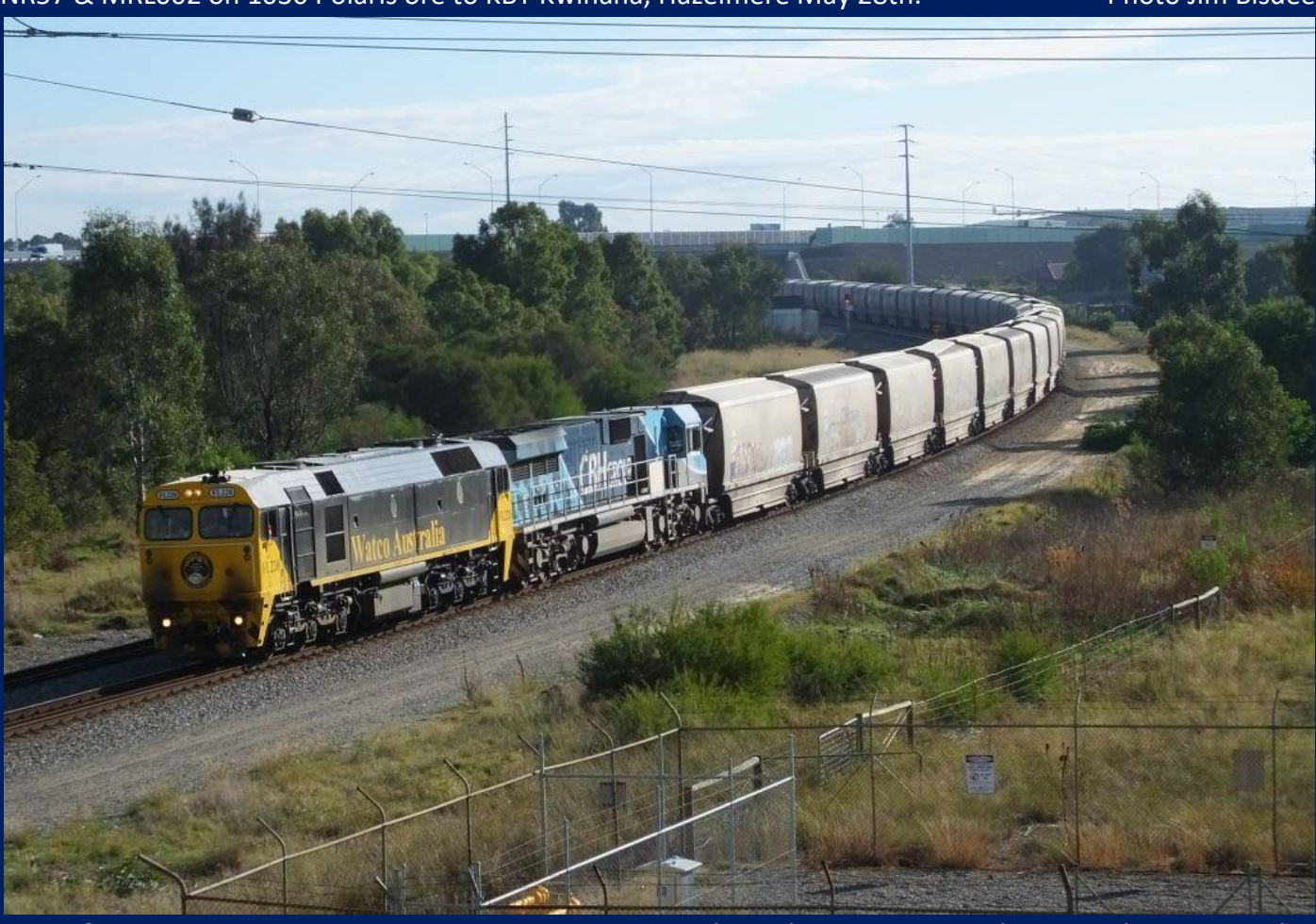
FL220 & CBH119 on 4S54 Watco grain to Kwinana terminal Wattle Grove May 24th.