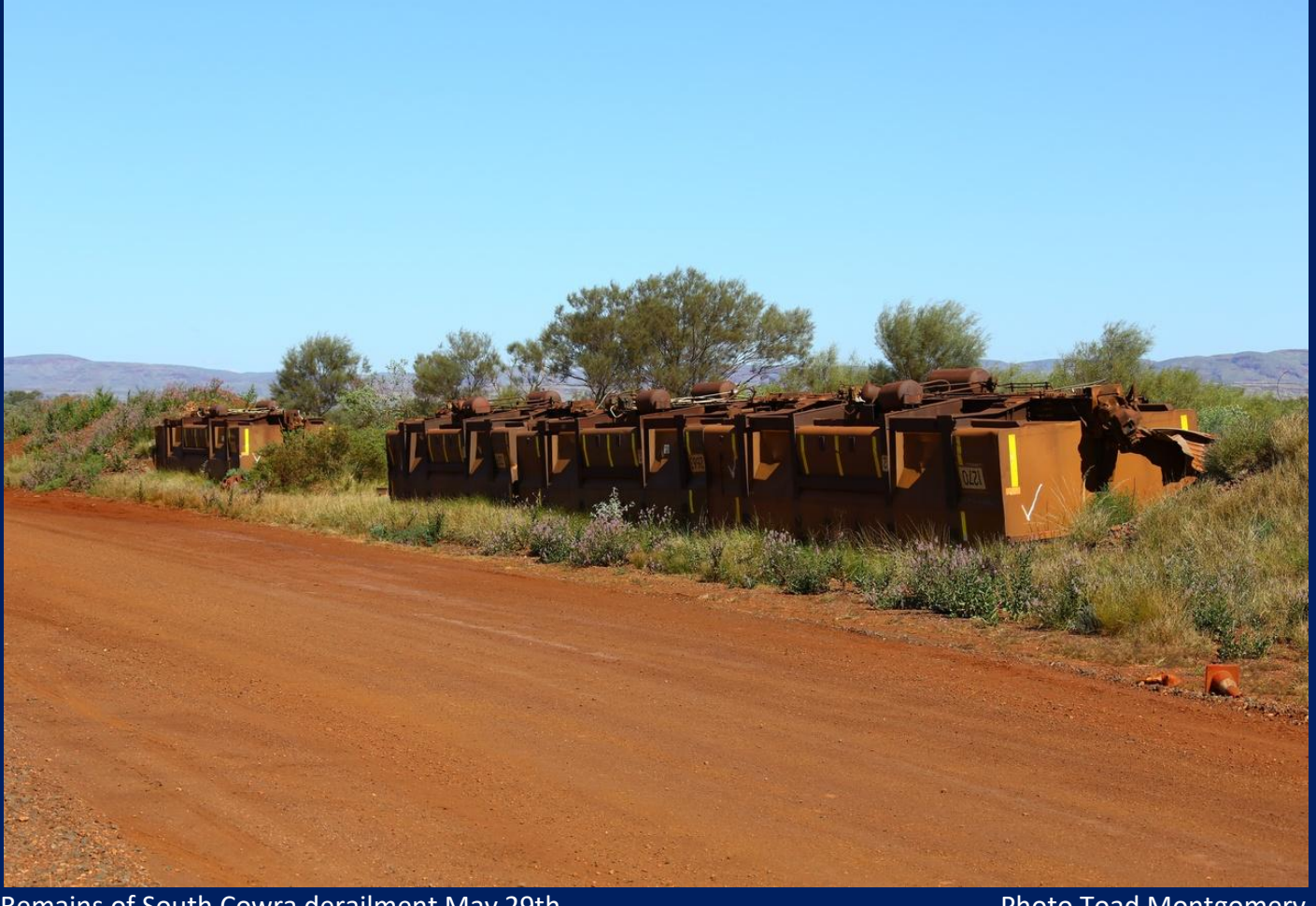
Remains of South Cowra derailment May 29th.