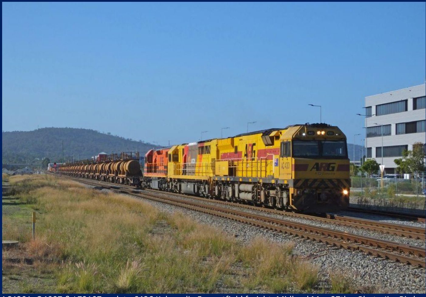
AC4301, Q4007 & LZ3107 on late 6426 Kalgoorlie Forrestfield freight, Midland May 27th.