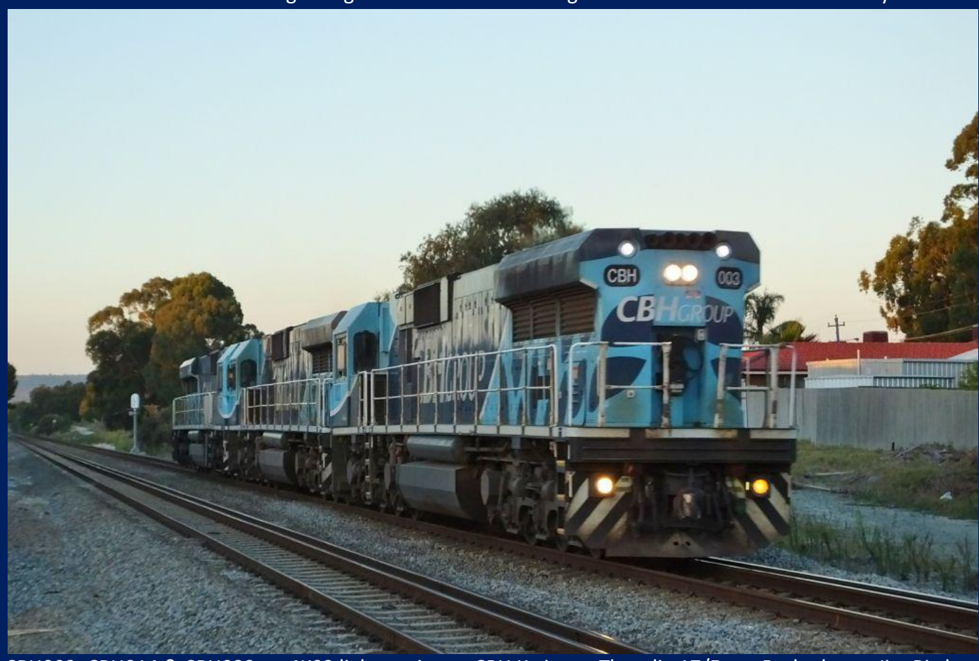
CBH003, CBH014 & CBH023 on 4K02 light engine to CBH Kwinana Thornlie 17/5.