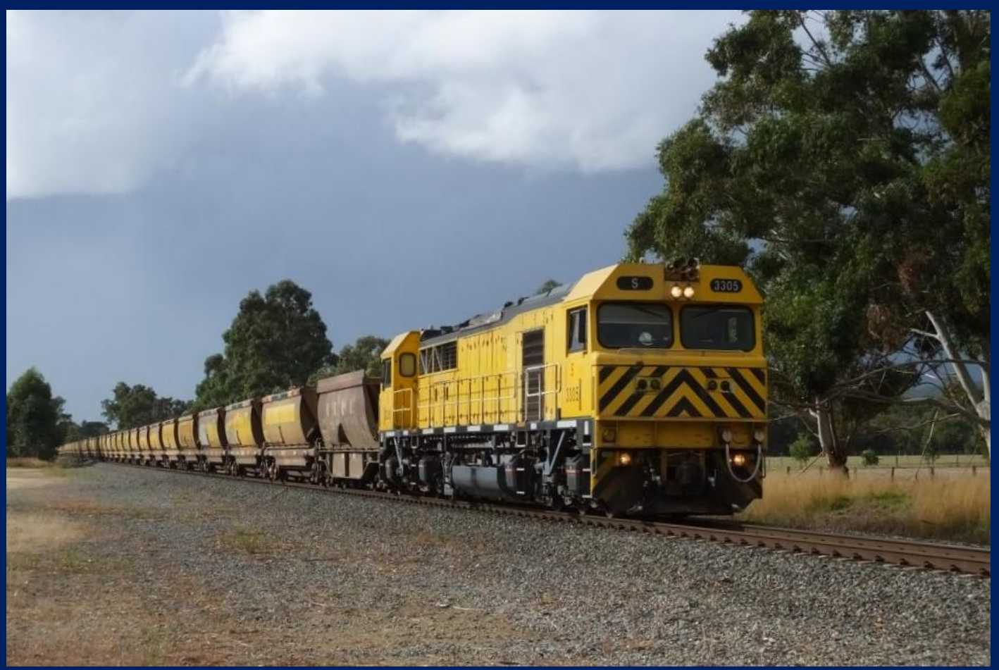
S3305 on 6953 empty bauxite to Calcine at Keysbrook May 19th.