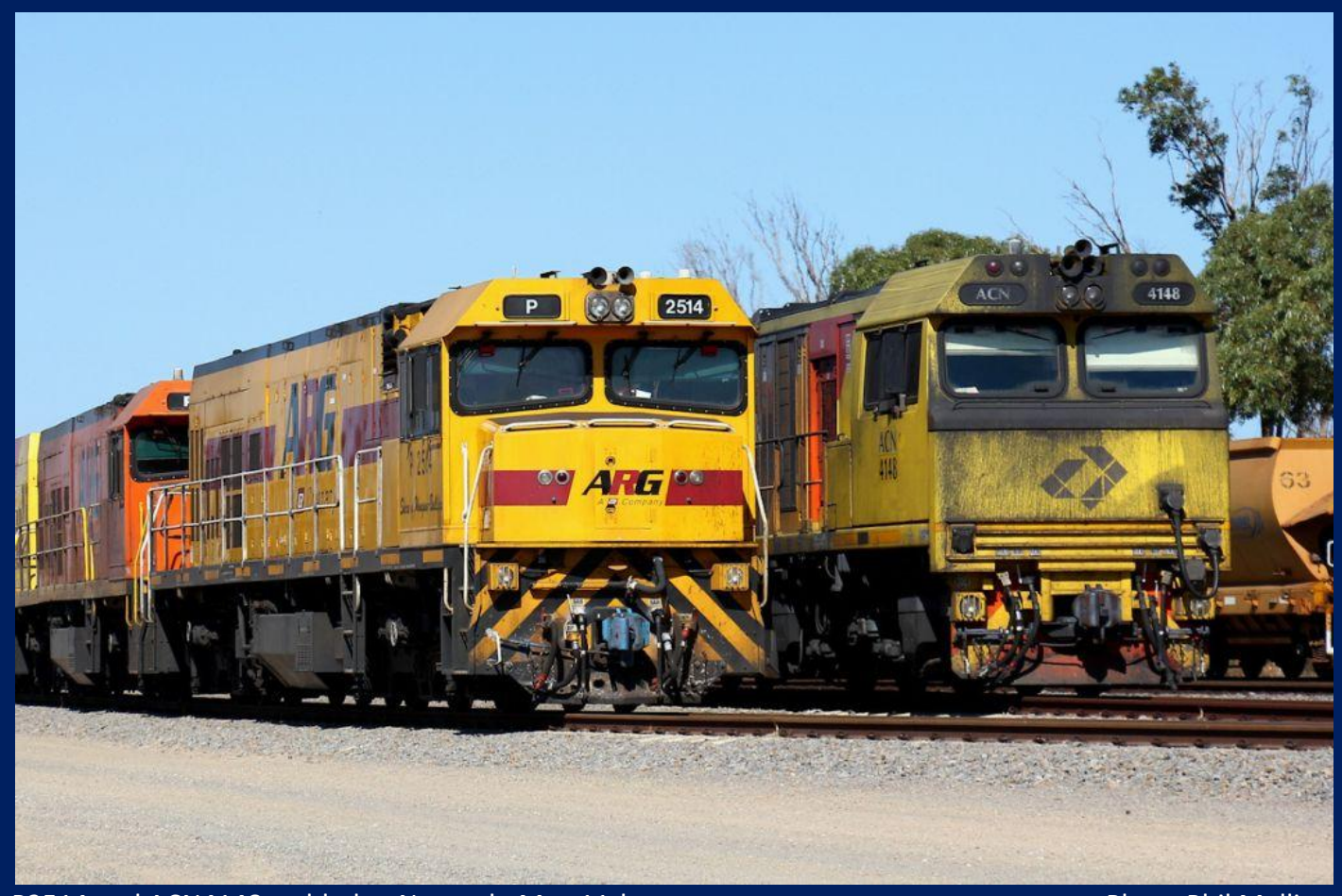
P2514 and ACN4148 stabled at Narngulu May 11th.