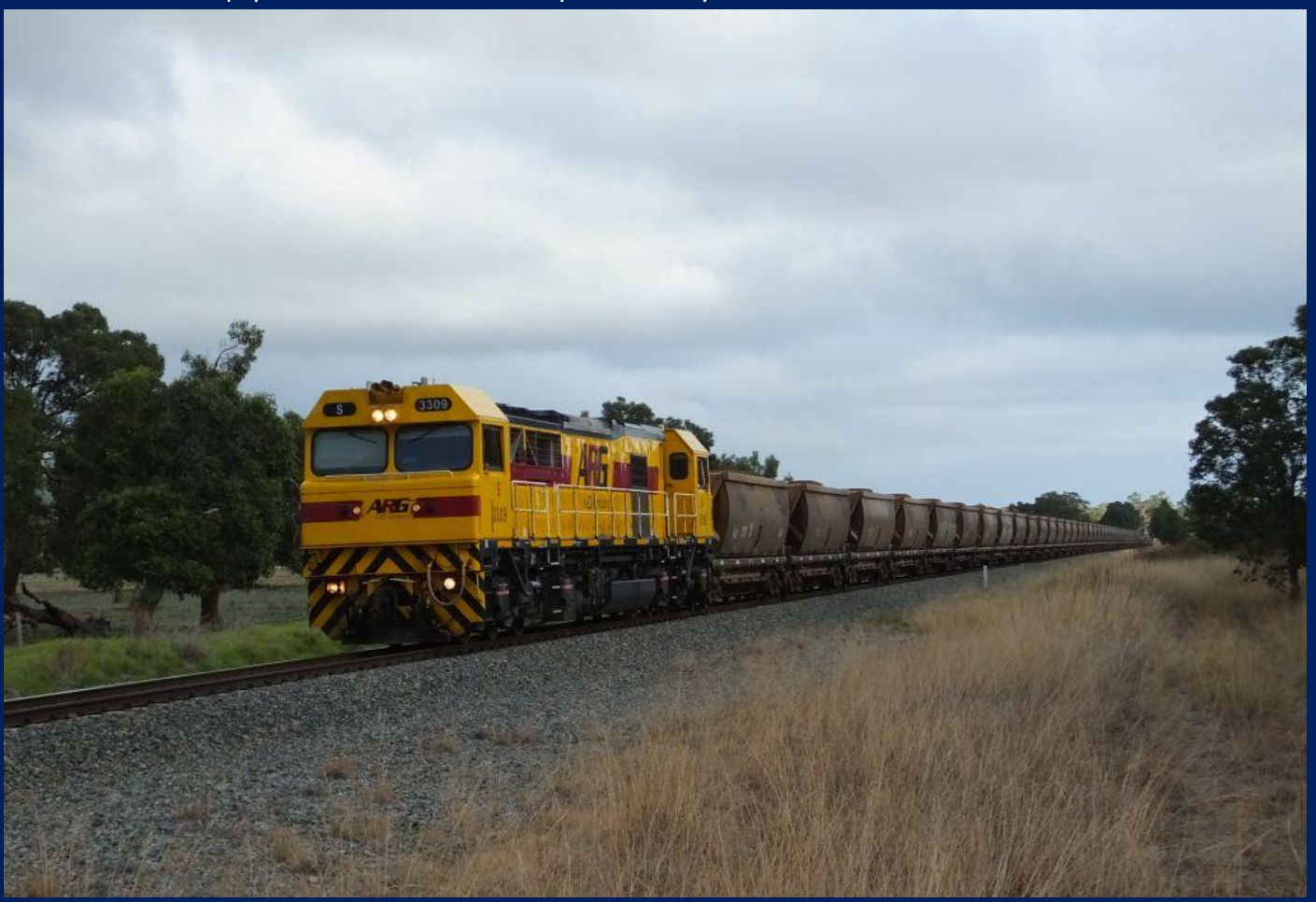
S3309 on 6944 bauxite Calcine to Kwinana at Keysbrook May 19th.