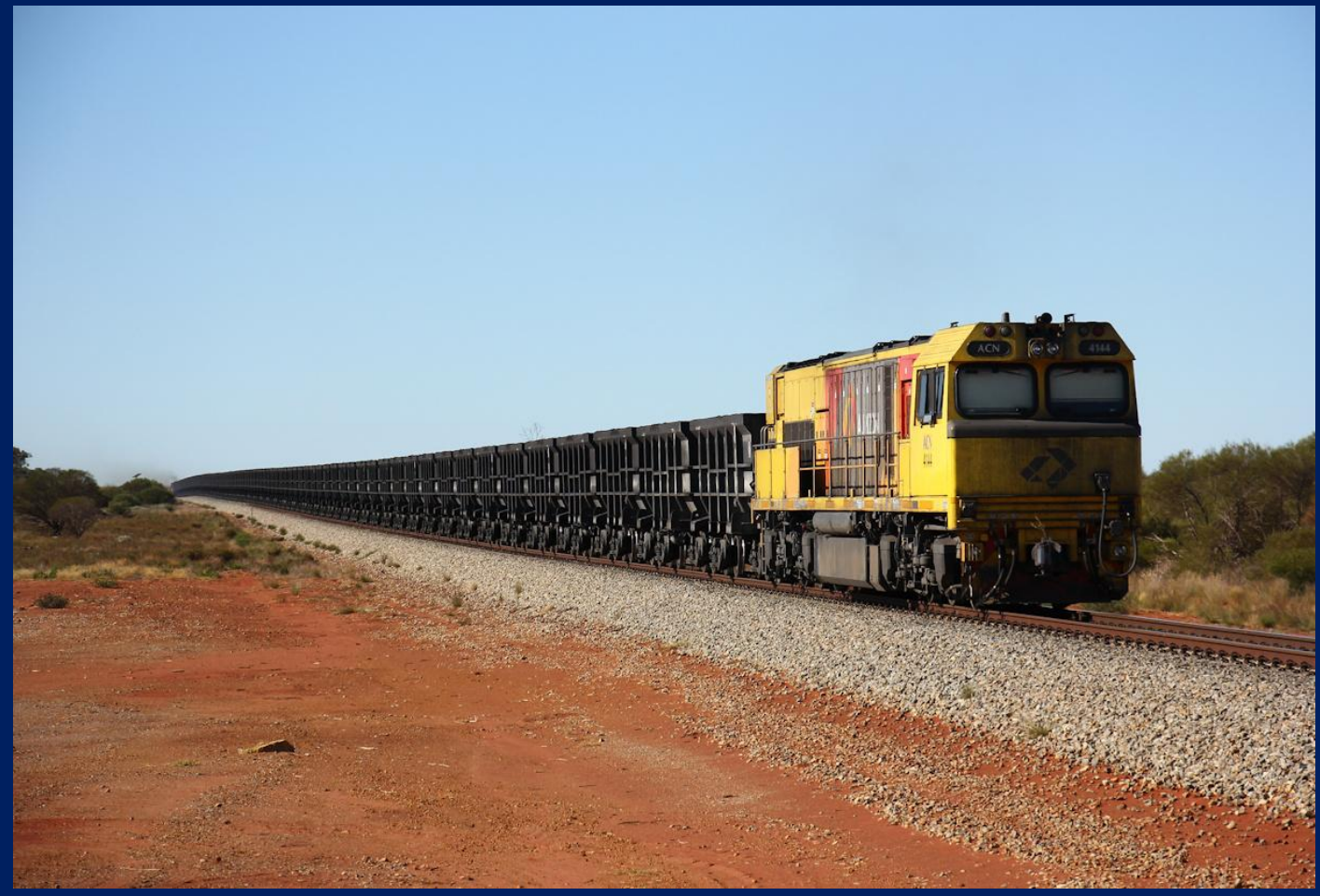
ACN4144 DPU on empty Karara ore Tenindewa May 28th.