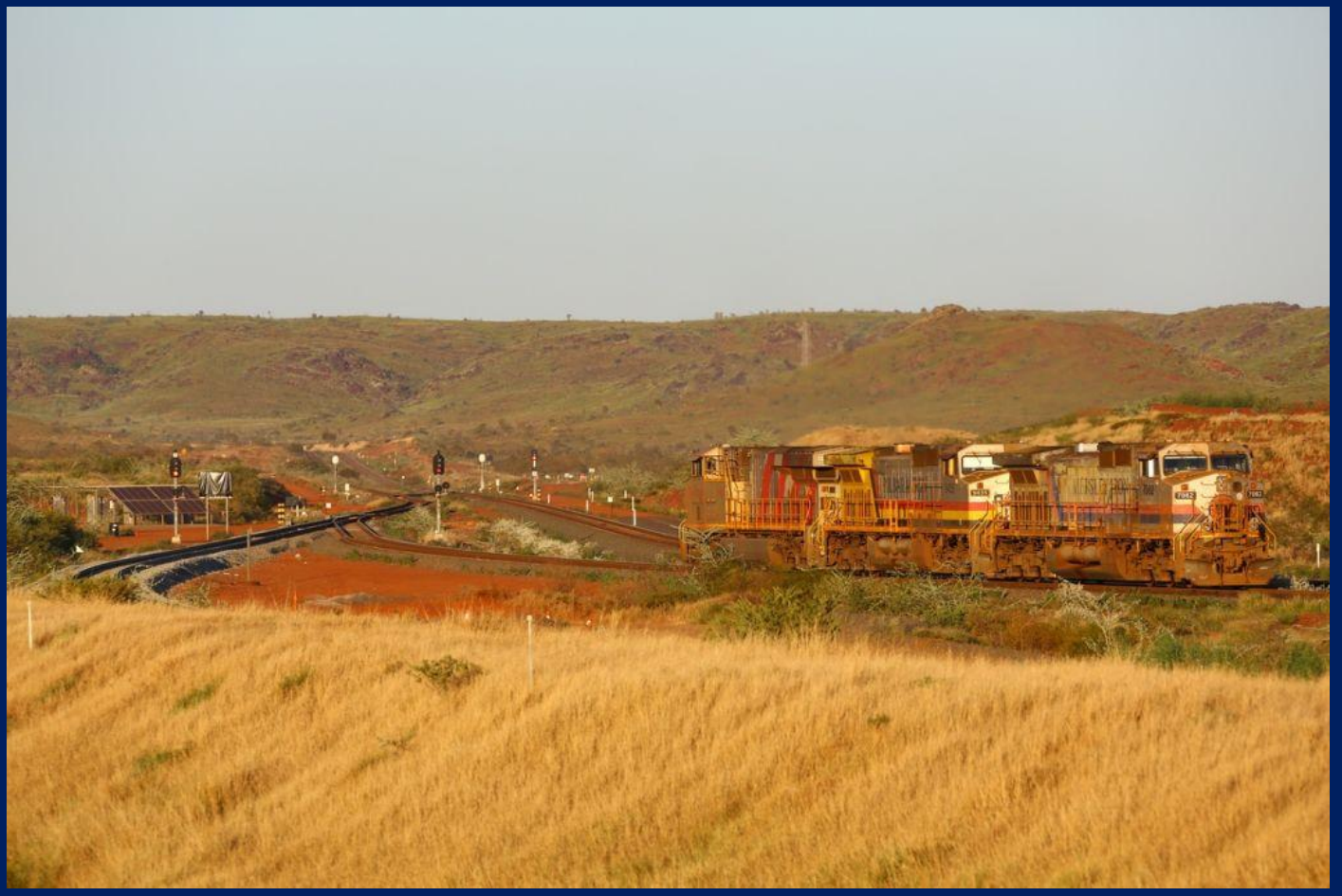
7082, 9435 & 8144 wait to shunt back into service shop South Yard 13/5.