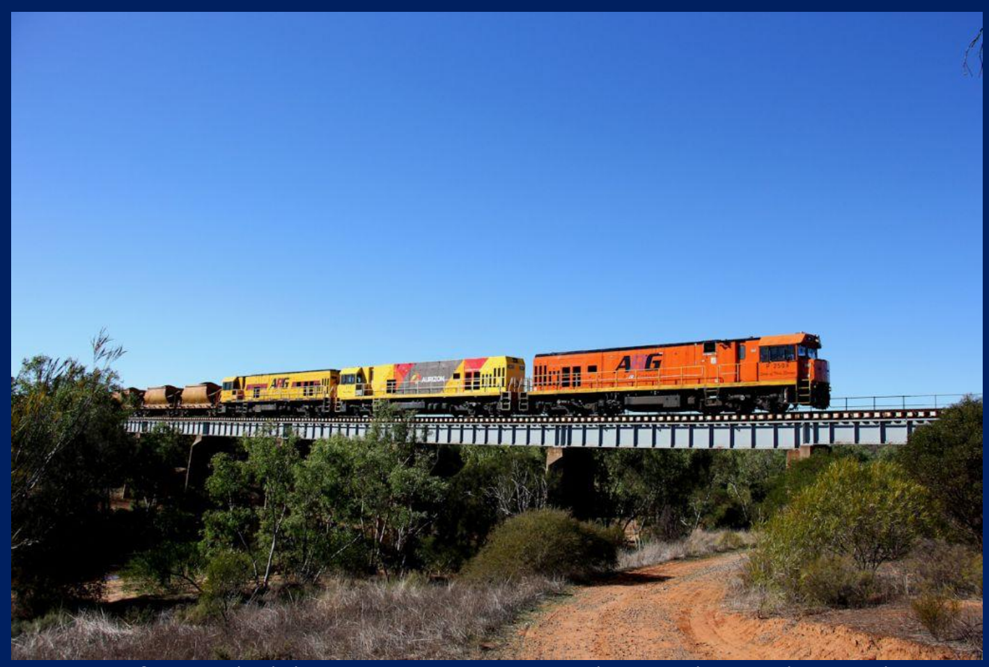
P2509, P2512 & P502 on loaded Perenjori ore crossing Greenough River Bridge at Eradu May 28th.