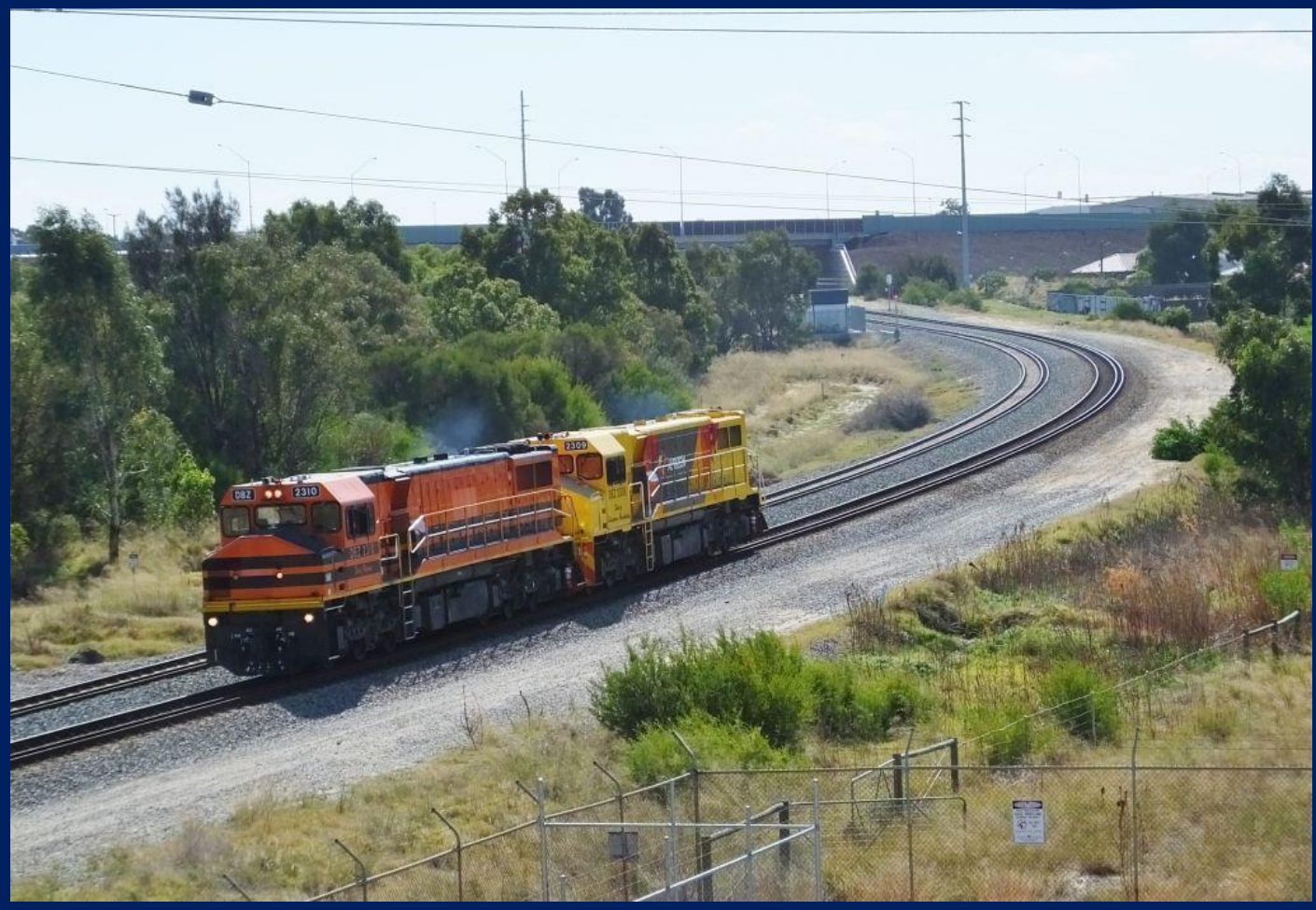
DBZ2310 & DBZ2309 on 4122 light engine to Kwinana returning units to service Wattle Grove May 17th.