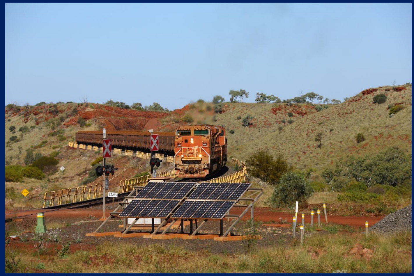
4420 & 4324 on loaded ore coming off Chichester Deviation May 29th.