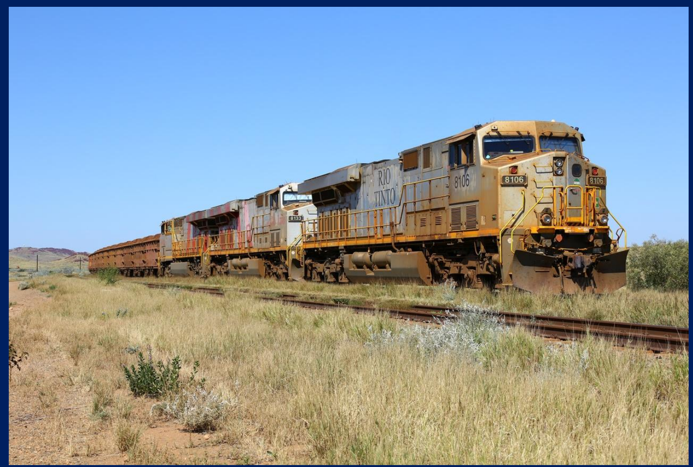
8106, 8133 & 9114 at Dingo siding on single track between Emu and Brolga on Dampier line for cross 13/5