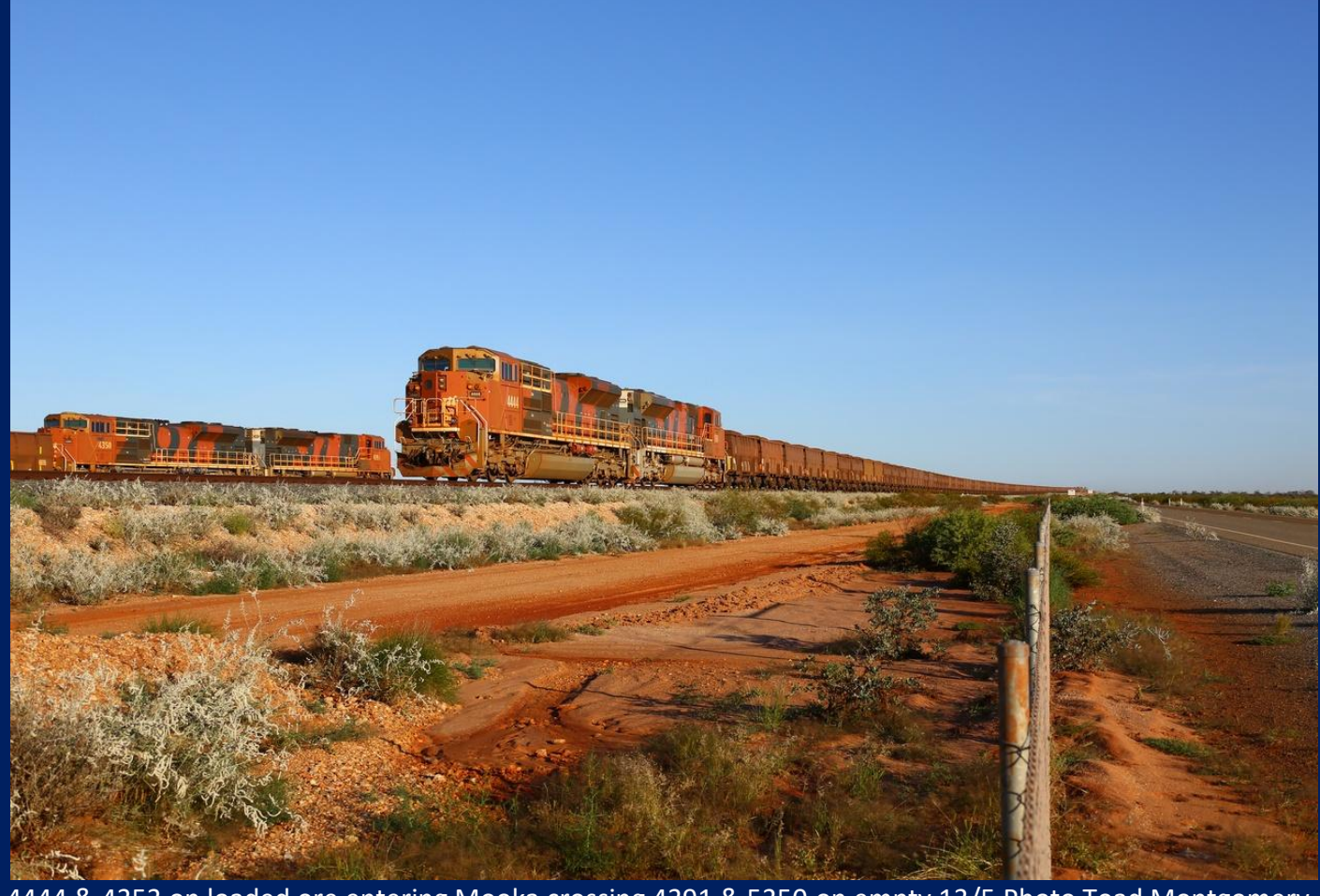
4444 & 4353 on loaded ore entering Mooka crossing 4391 & 5350 on empty 13/5.