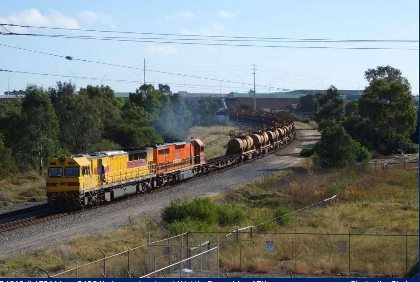
Q4013 & LZ3111 on 3426 Kwinana shunter at Wattle Grove May 17th.