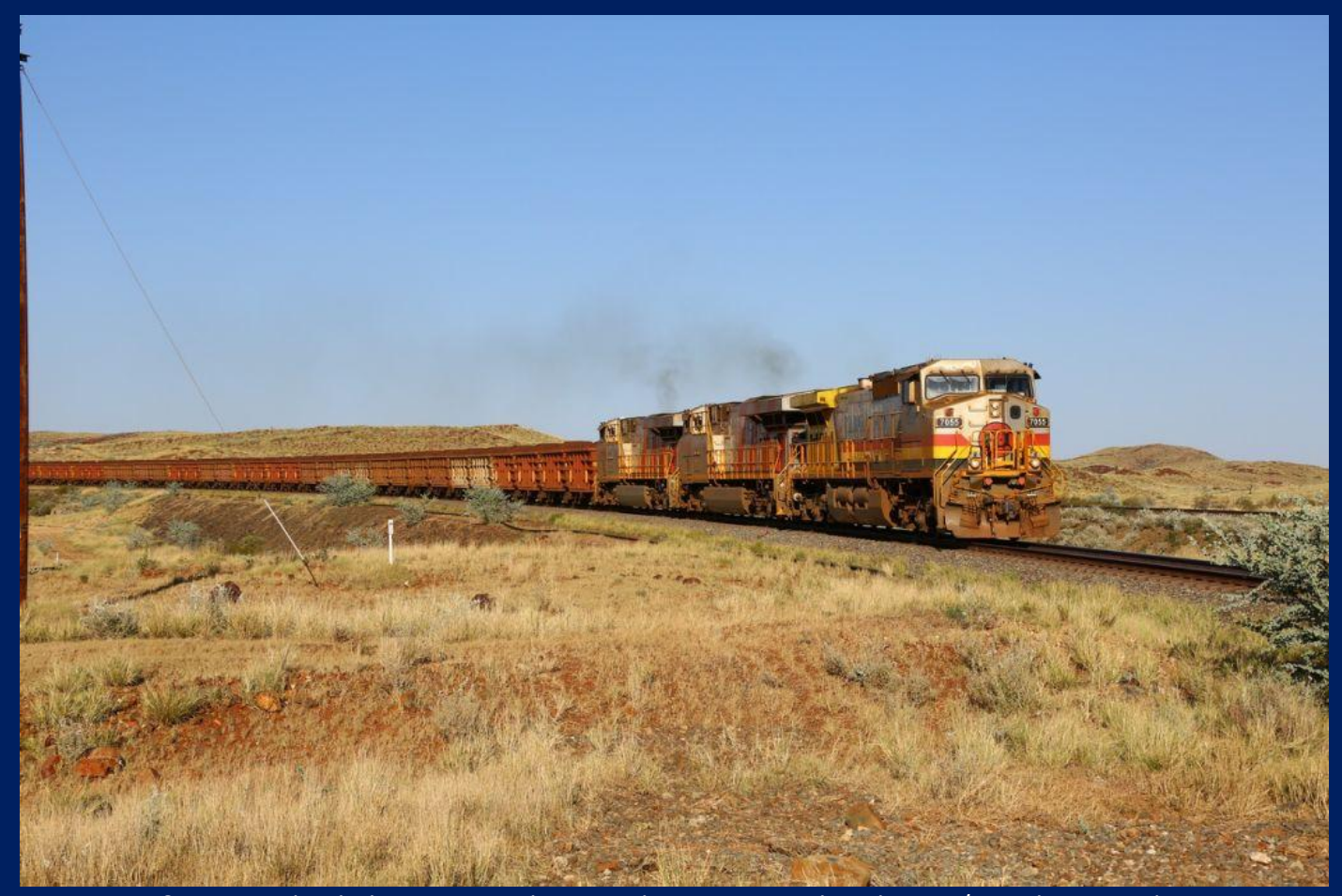
7055, 8154 & 8194 on loaded ore approaching Harding, Cape Lambert line 13/5.