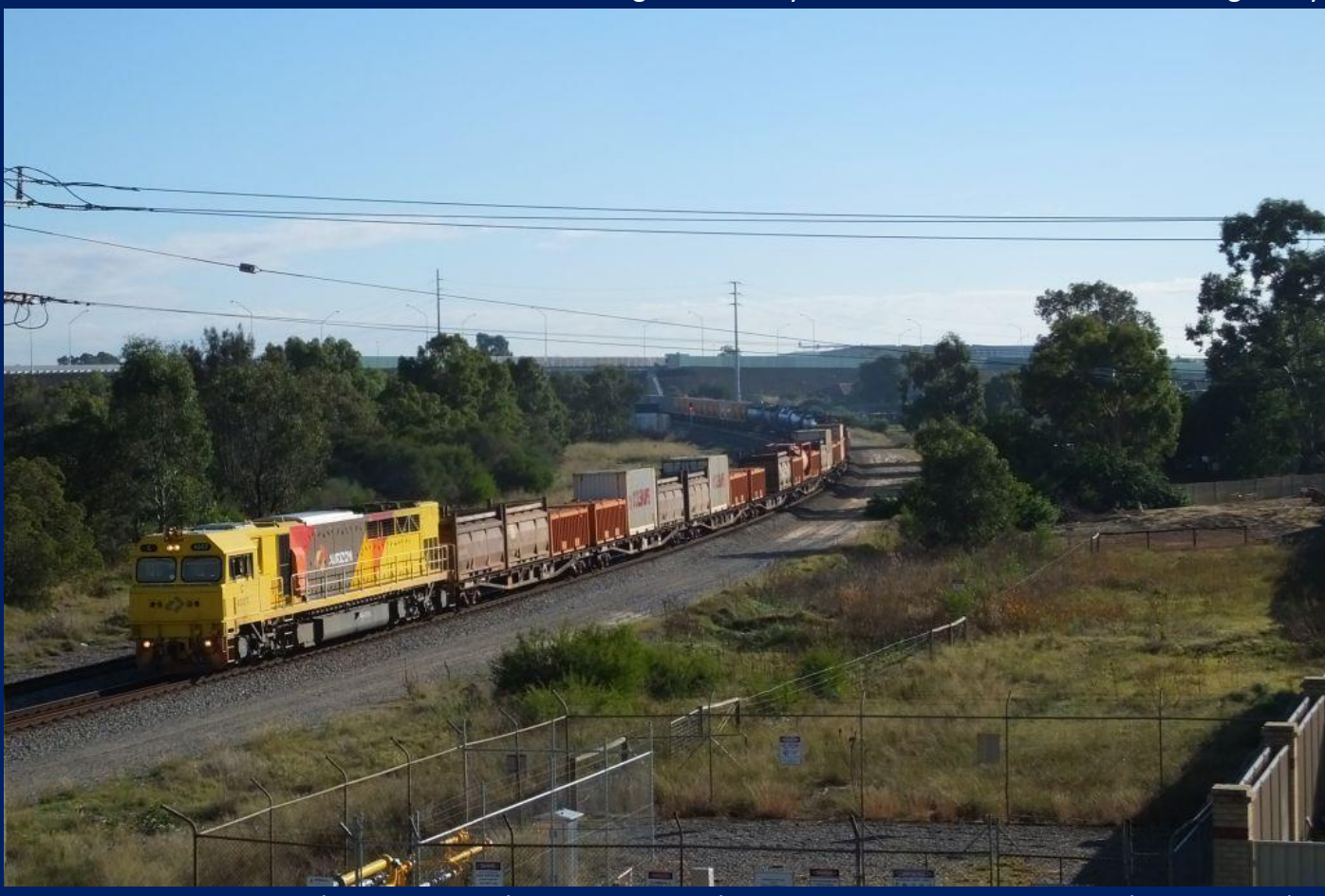
Q4007 on 3426 Kwinana shunter at Wattle Grove May 24th.