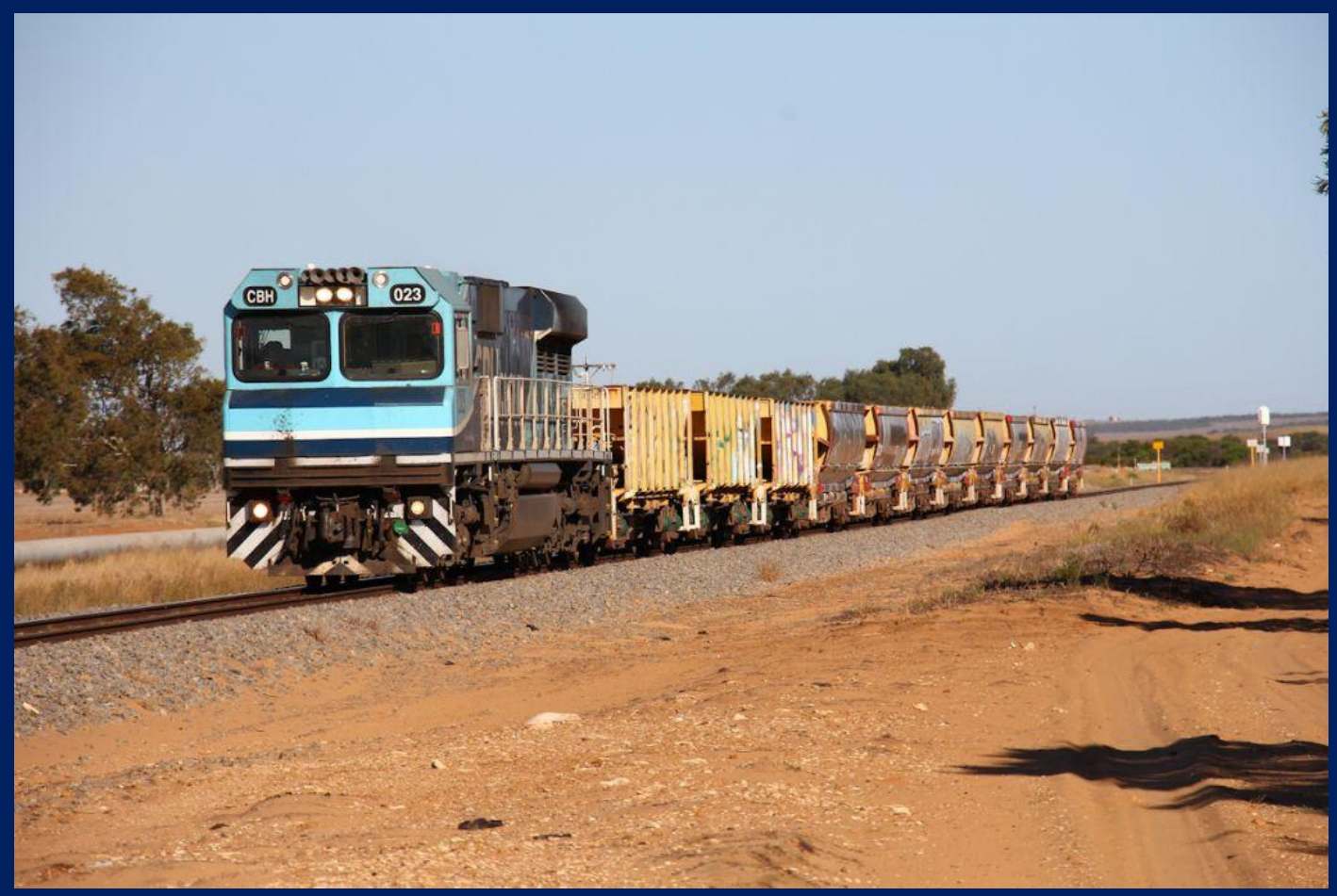
CBH023 on 1BT1 empty ballast train Midland to Narngulu near Bootenal May 7th.