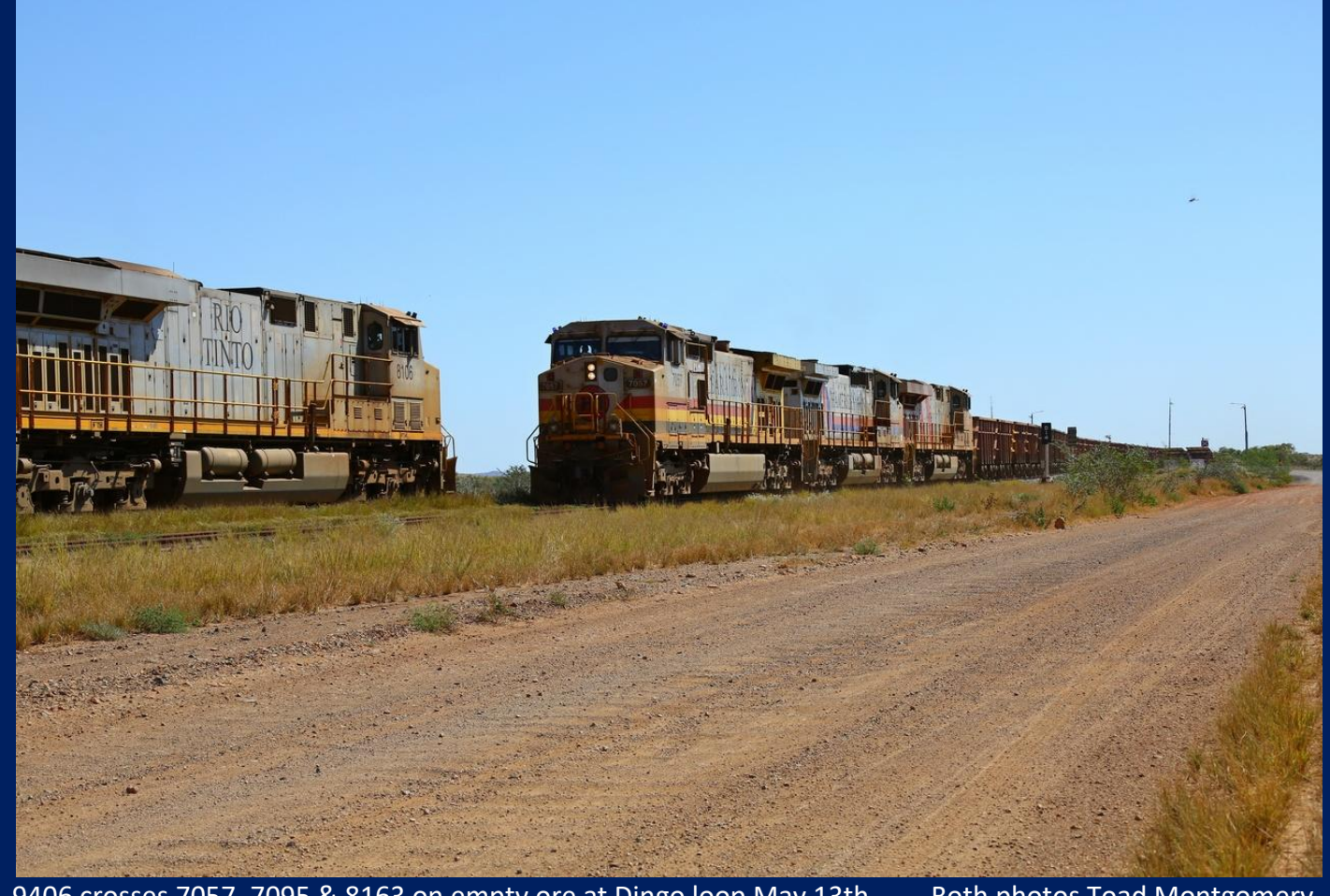
9406 crosses 7057, 7095 & 8163 on empty ore at Dingo loop May 13th.