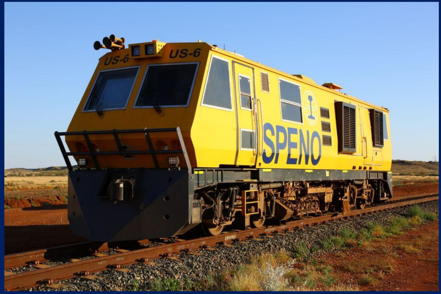
Speno ultra sonic rail flaw detector vehicle US-6 at Archers Siding May 13th.