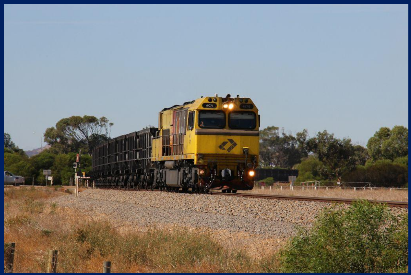
ACN4170 on 7761 Karara ore to Geraldton Port near Narngulu May 6th.