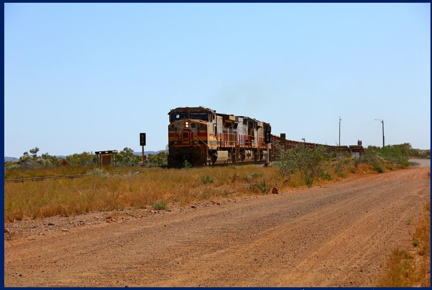
7057, 7095 & 8163 on empty ore ex Dampier enters passing track Dingo 13/5.