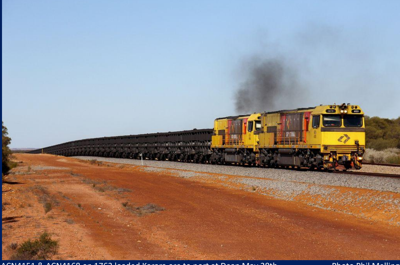
ACN4151 & ACN4168 on 1763 loaded Karara ore to port at Dean May 28th.