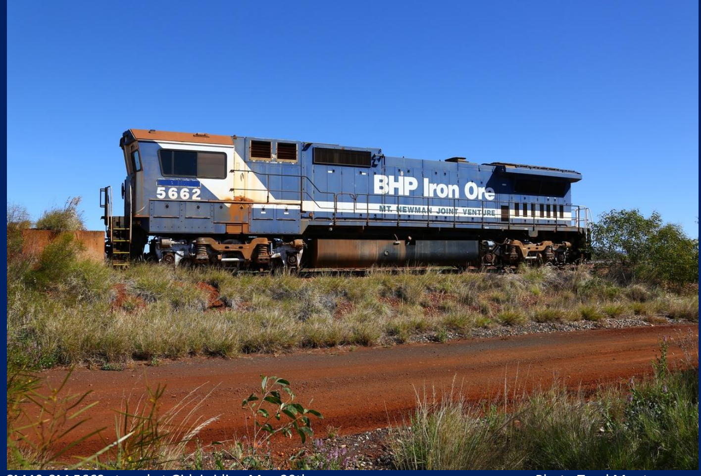
CM40-8M 5662 stored at Gidgi siding May 29th.