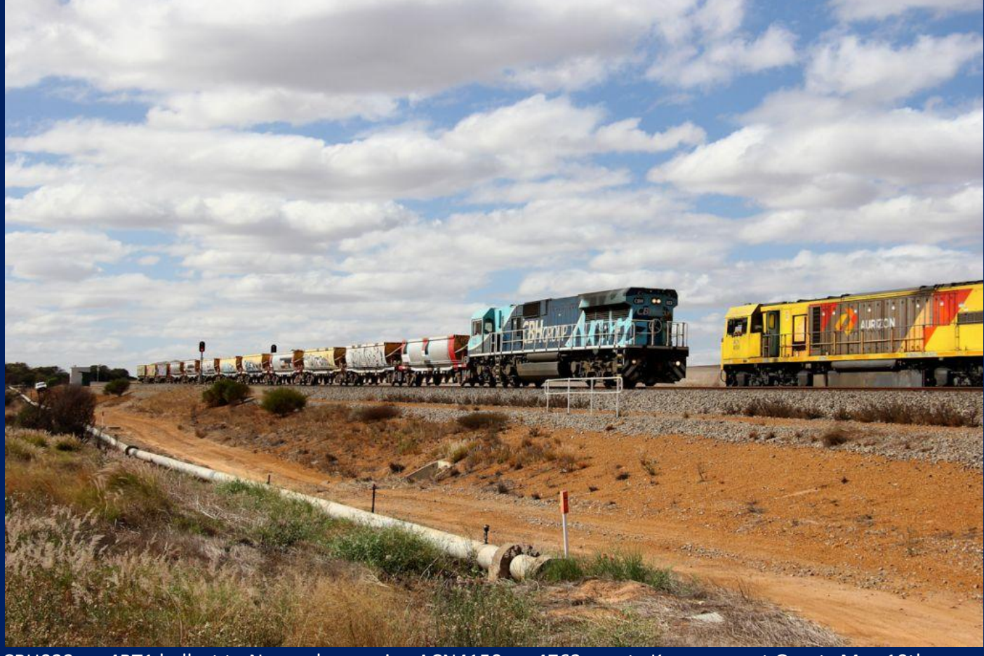
CBH023 on 4BT1 ballast to Narngulu crossing ACN4150 on 4762 empty Karara ore at Grants May 10th.