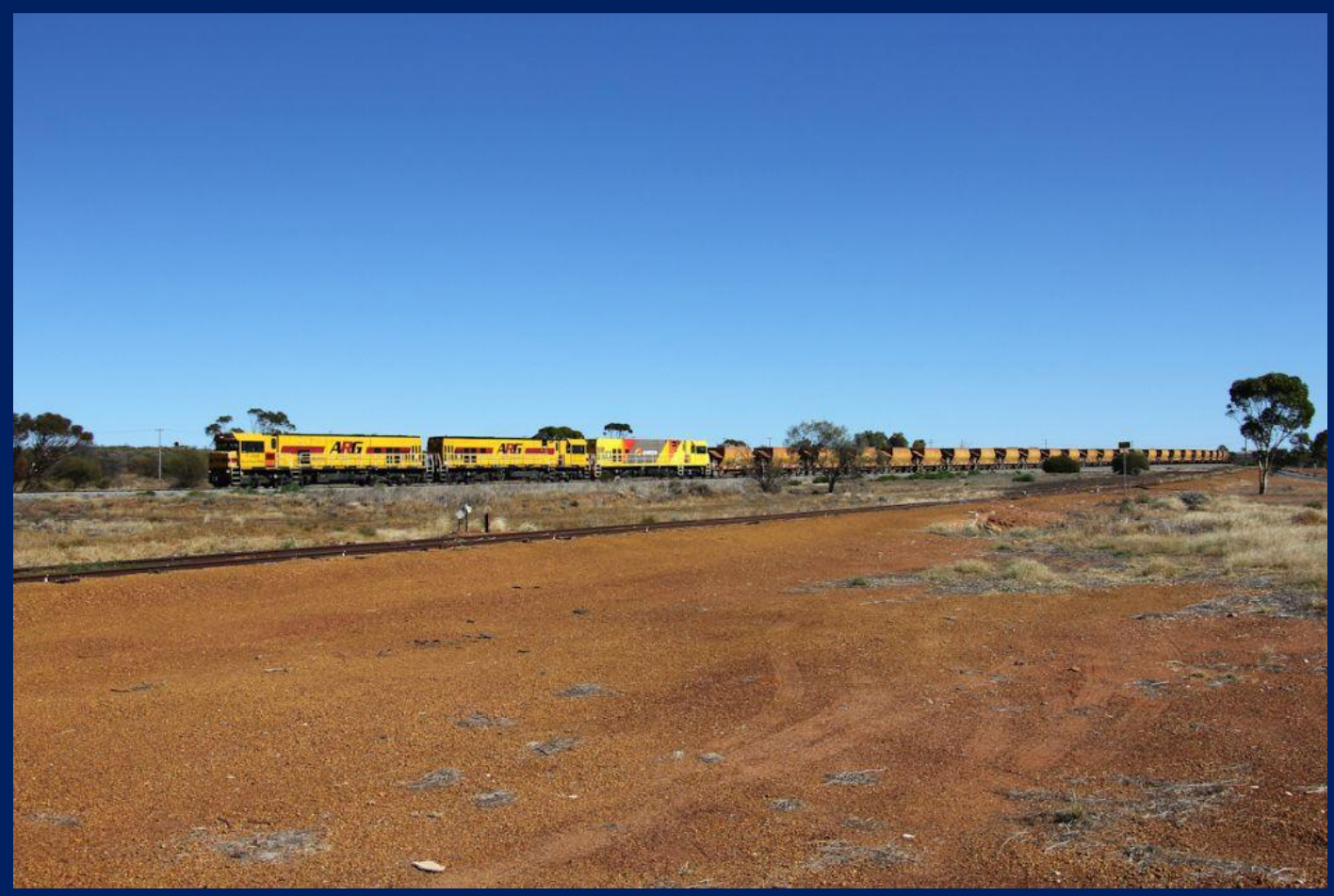
Old Meekatharra line in front P2514, P2501 & P2506 run empty ore thru Mullewa 28/5.