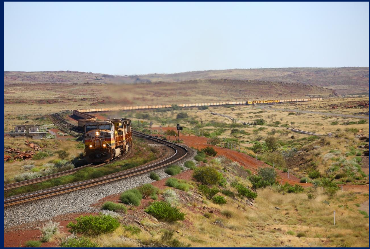
9433, 7058 & 7080 on empty ore off Cape Lambert line climbing out of Emu Speno rail grinder in back 13/5