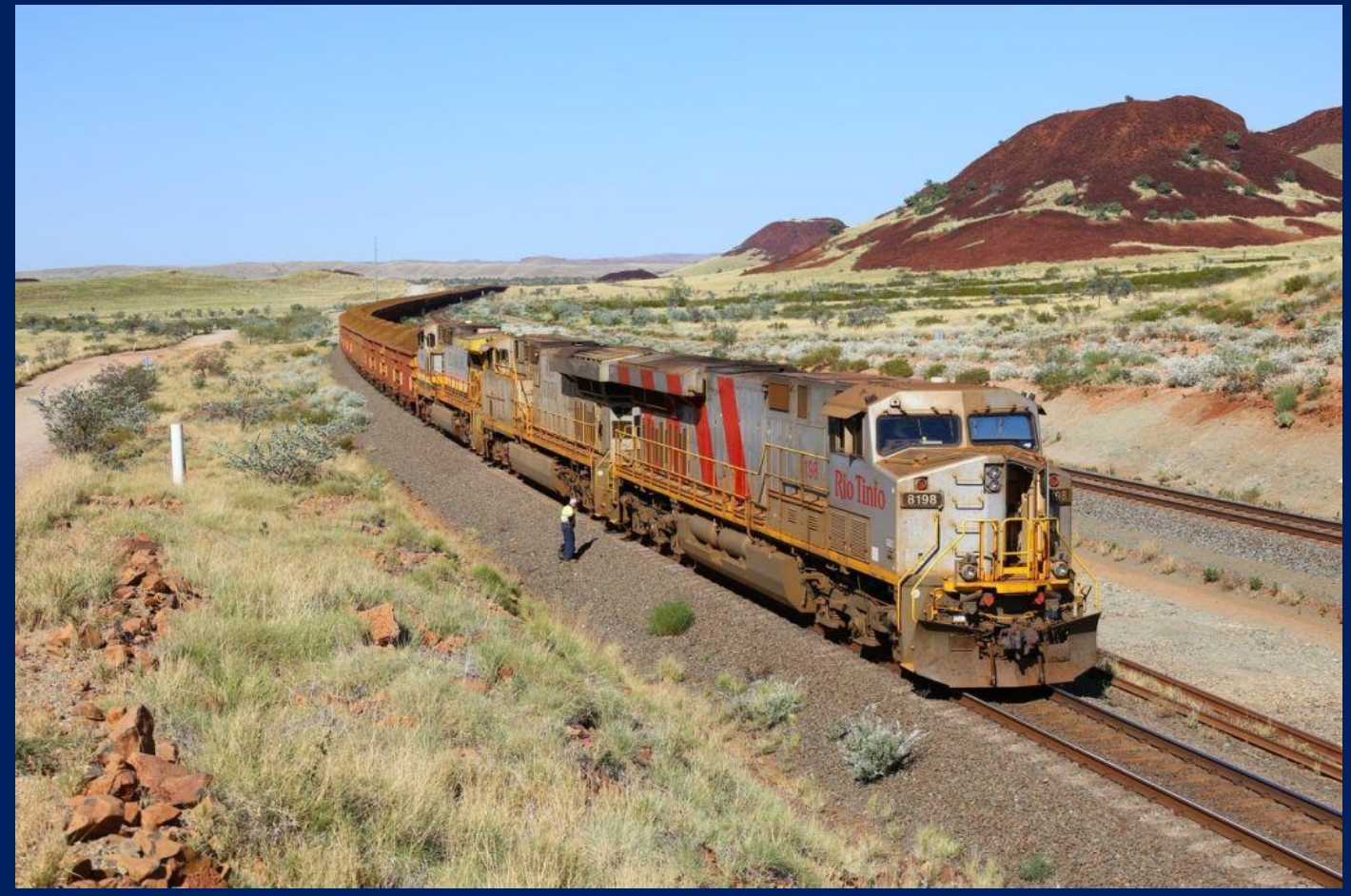
8198, 8105 & 9430 on loaded ore standing at Green Pool following the parting of ore cars May 13th.