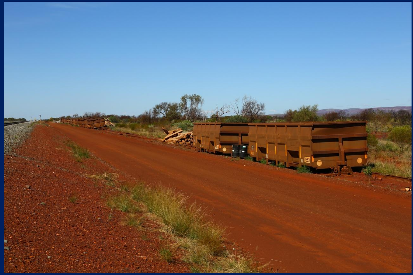
Remains of derailment at Yandi Junction May 29th.