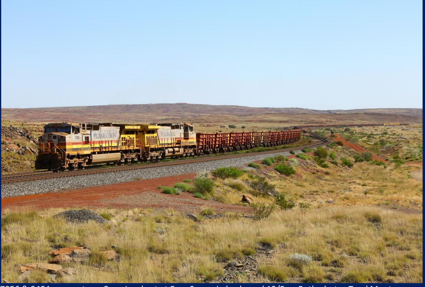
7056 & 9404 on empty ex Cape Lambert at Emu Speno in back road 13/5.