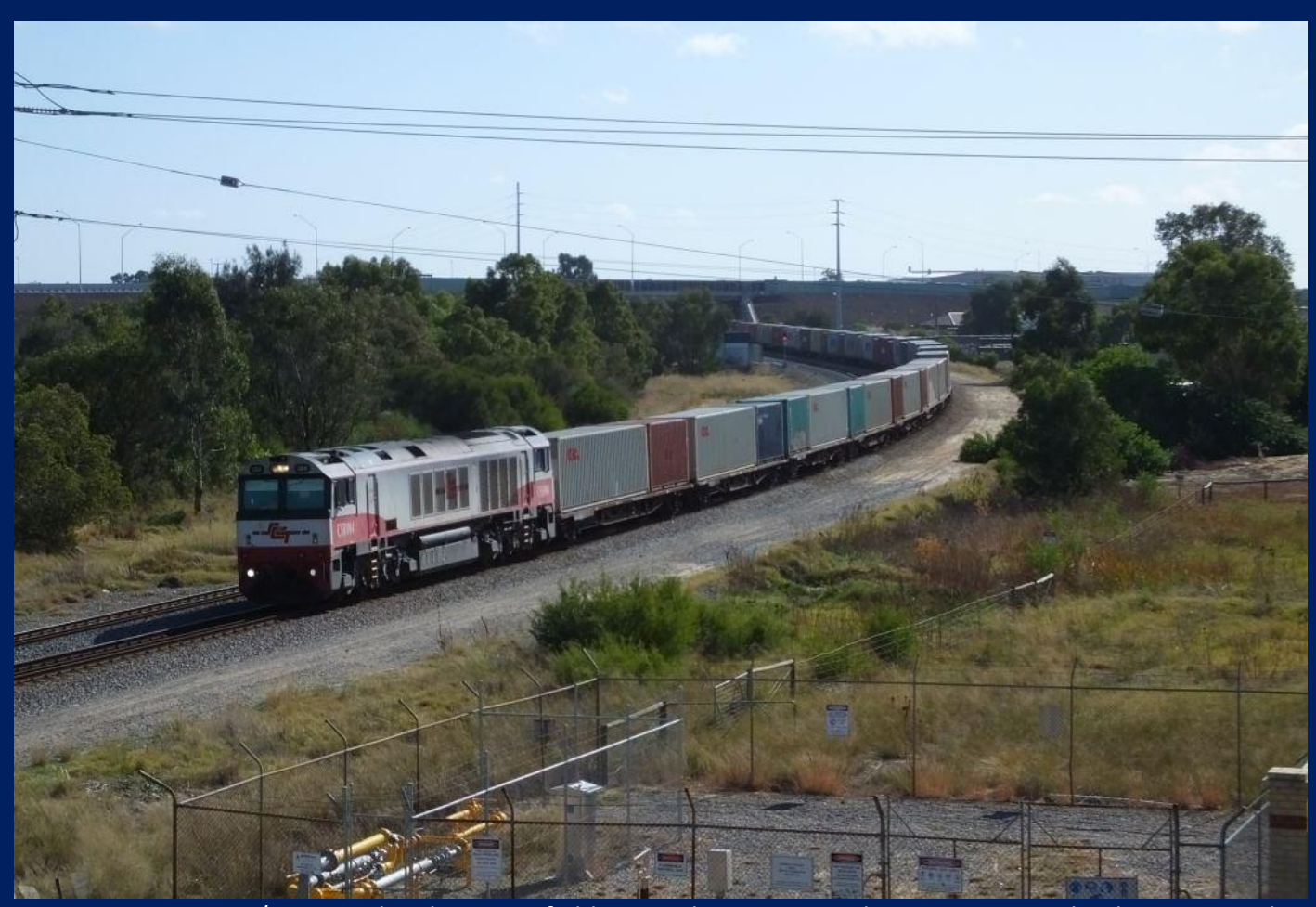
CSR004 on 4142 SCT/ILS port shuttle Forrestfield to North Port at Wattle Grove May 17th.