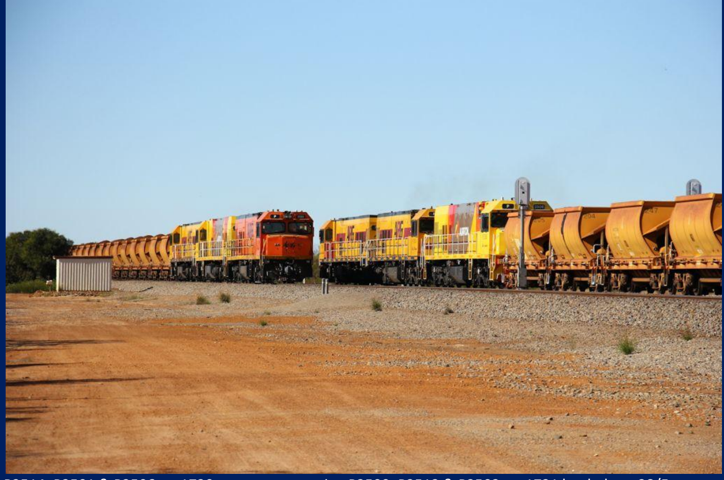
P2514, P2501 & P2506 on 1720 empty ore crossing P2509, P2512 & P2502 on 1721 loaded ore 28/5.