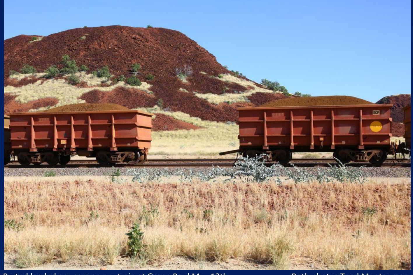
Parted loaded ore cars on ore train at Green Pool May 13th.