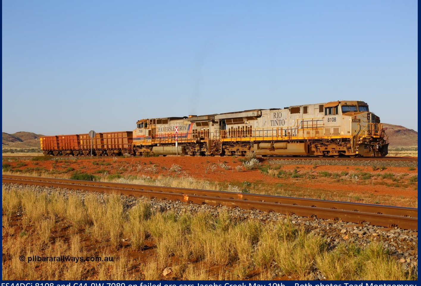
ES44DCi 8108 and C44-9W 7089 on failed ore cars Jacobs Creek May 10th.