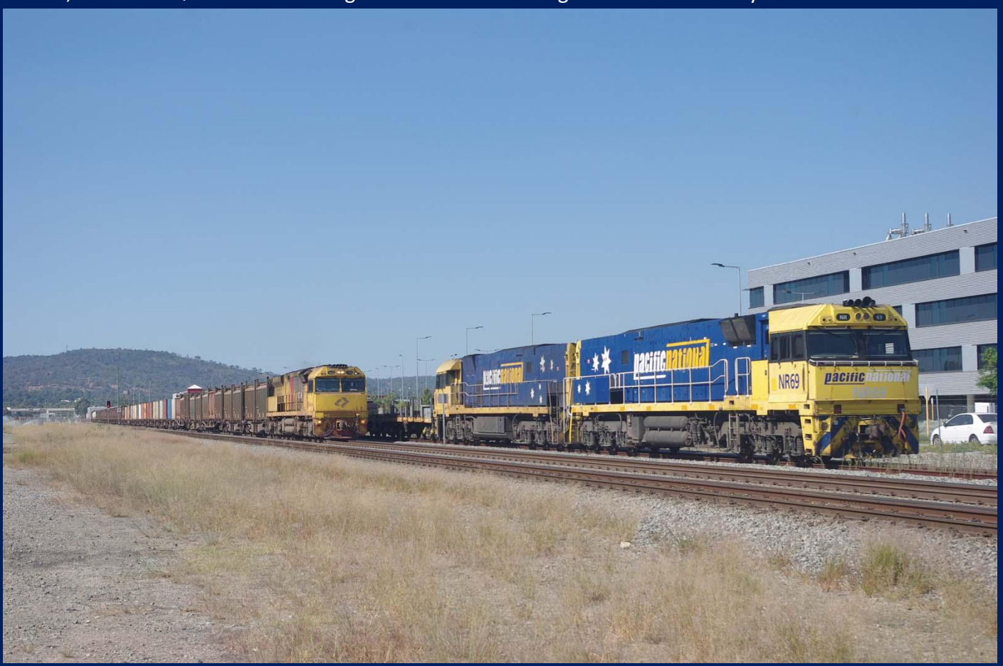
NR69 & NR98 on 6P32 Flashbutt rail yard shunter with empty rail wagons in loop Midland bypassed by ACB4403 on 5430 empty sulphur from Malcolm April 28th.