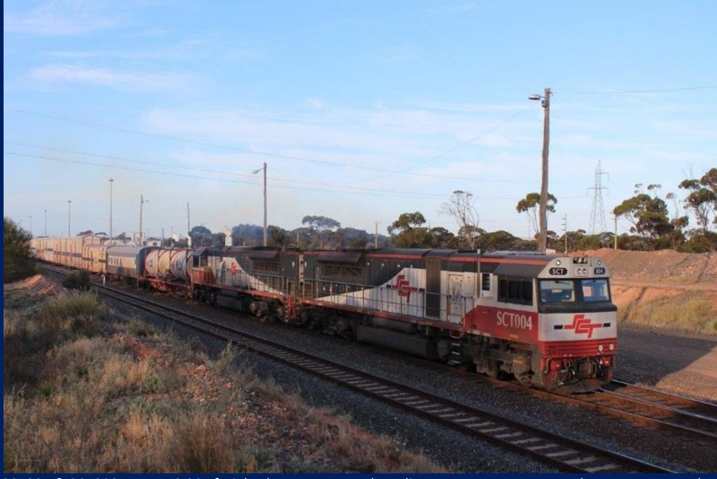
SCT004 & SCT008 on 7MP9 SCT freight departs West Kalgoorlie May 1st.