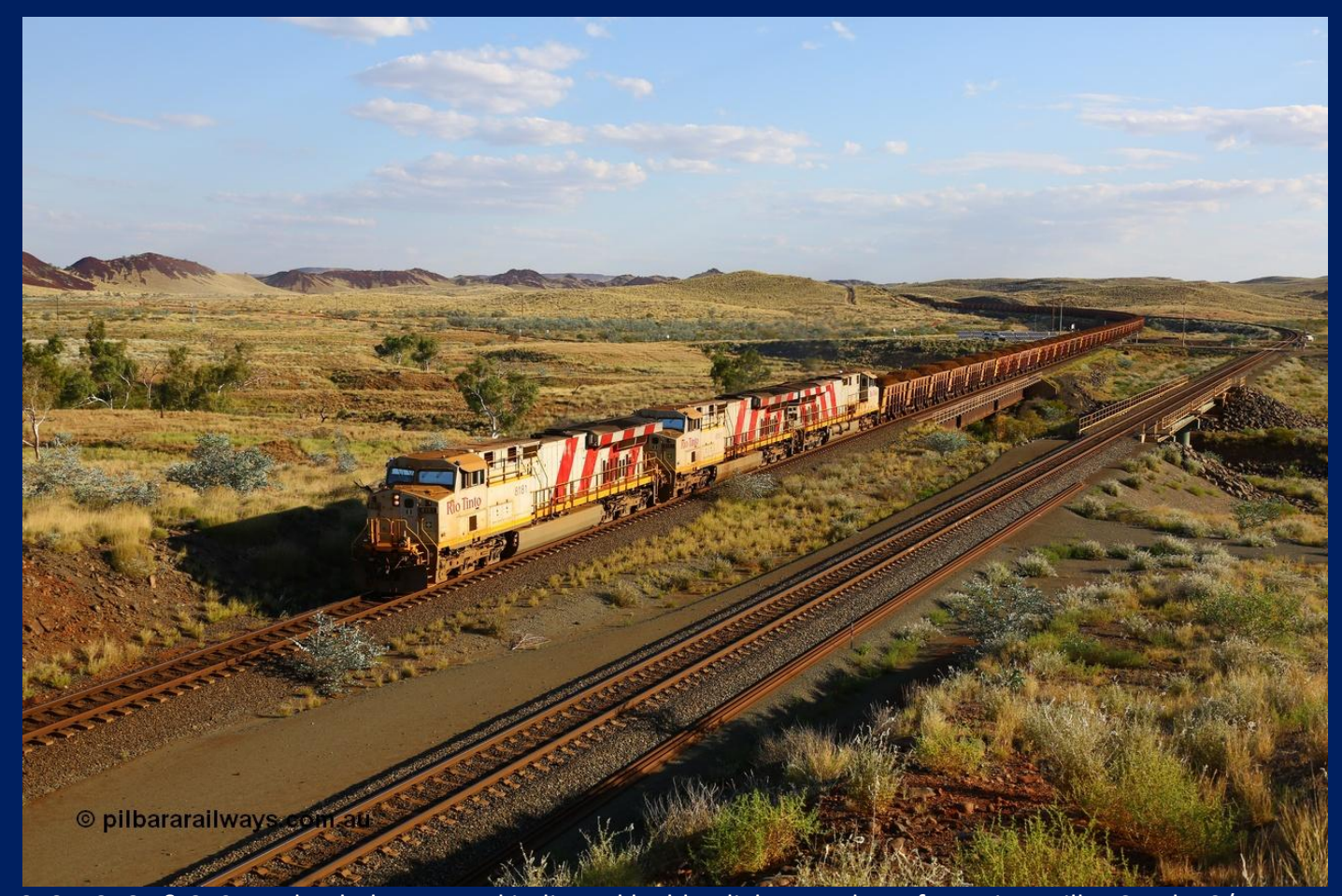
8181, 8161 & 8195 on loaded Auto Haul indicated by blue light on cab roof crossing Miller Creek 10/5.