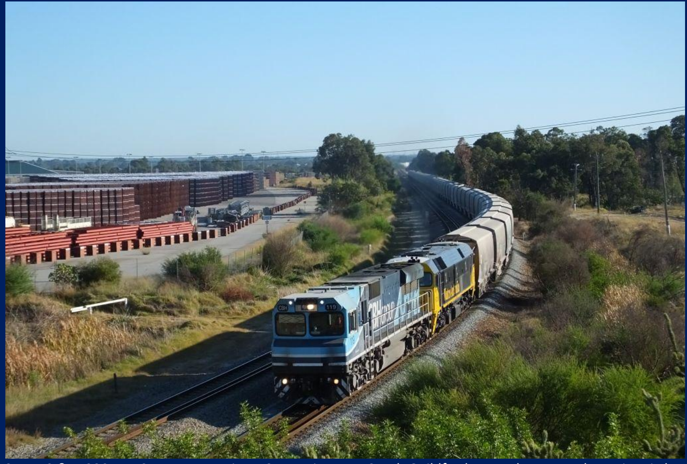
CBH119 & FL220 on 1S54 Watco grain to CBH Kwinana at South Guildford May 7th.