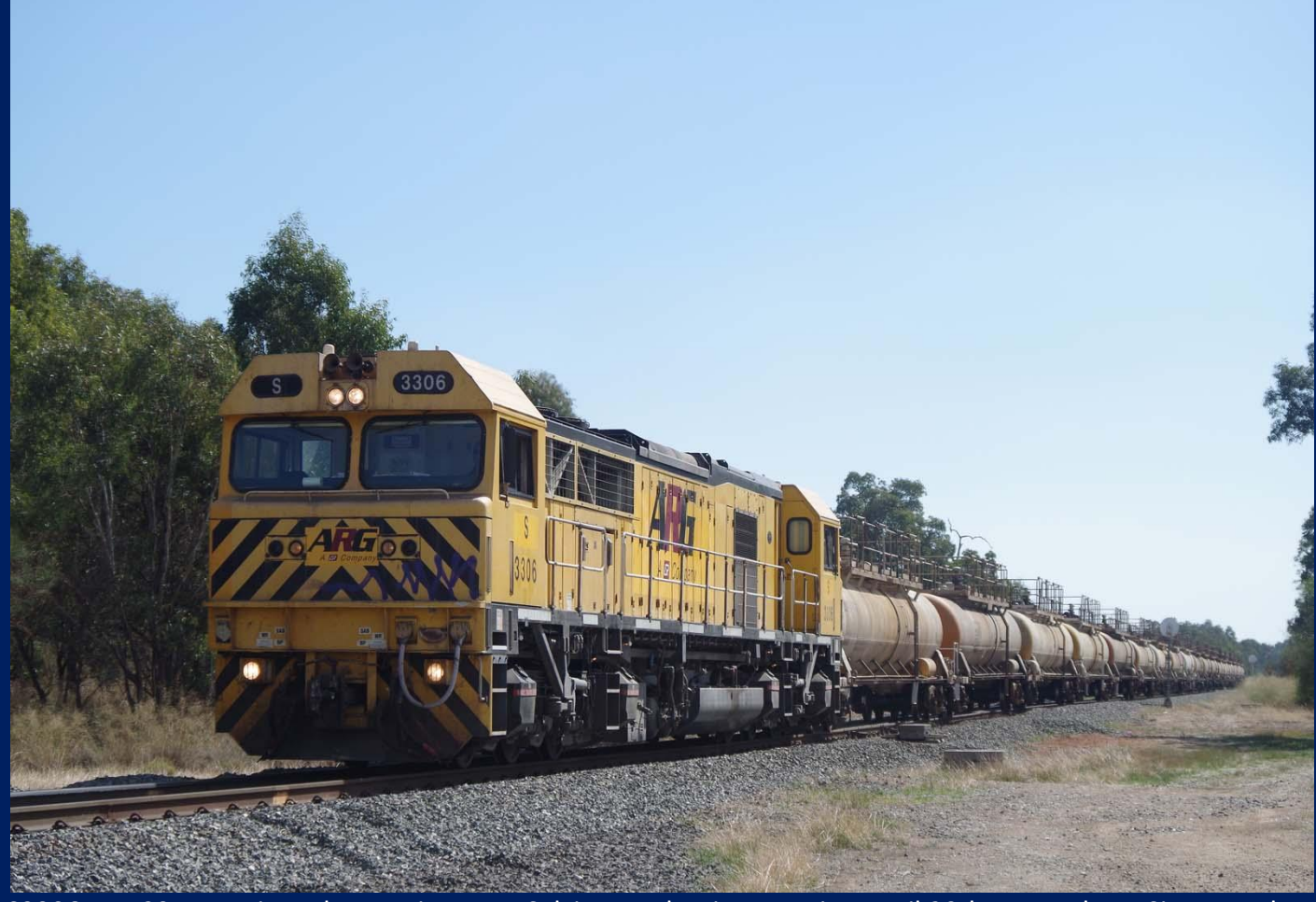
S3306 on 5237 caustic tankers Kwinana to Calcine at Alumina Junction April 20th.