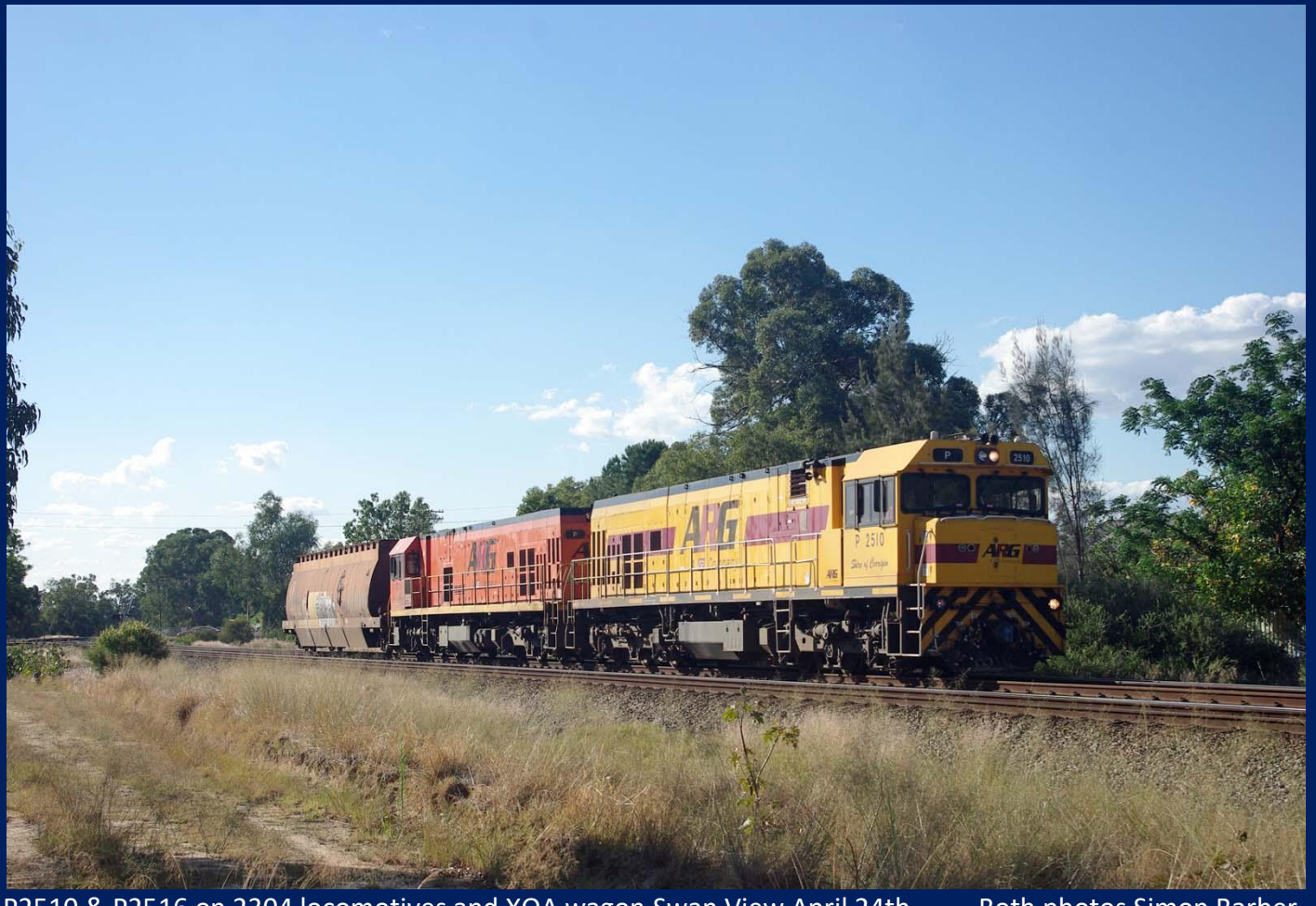
P2510 & P2516 on 2304 locomotives and XOA wagon Swan View April 24th.