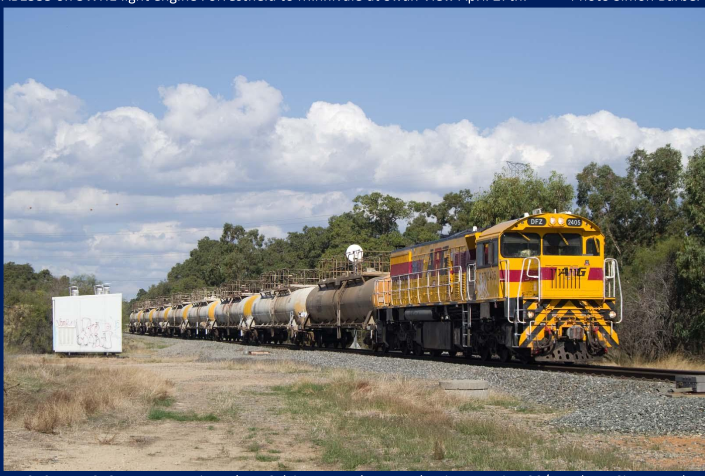
DFZ2405 on 5943 empty caustic tankers Calcine to Bunbury at Alumina Junction 20/4.