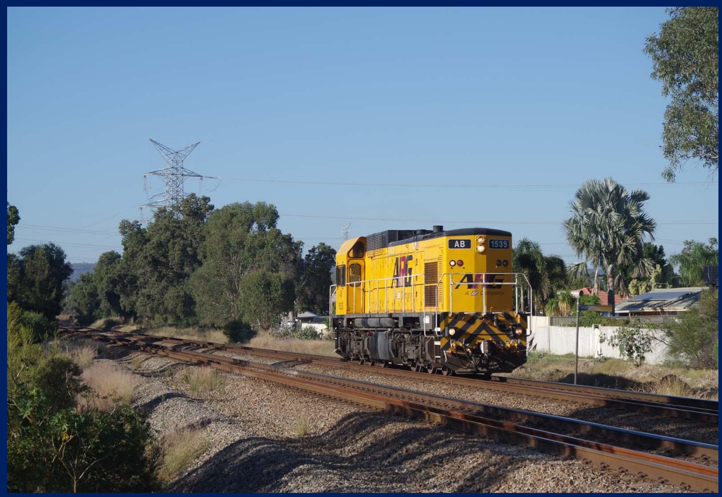
AB1535 on 5WH1 light engine Forrestfield to Minnivale at Swan View April 27th.