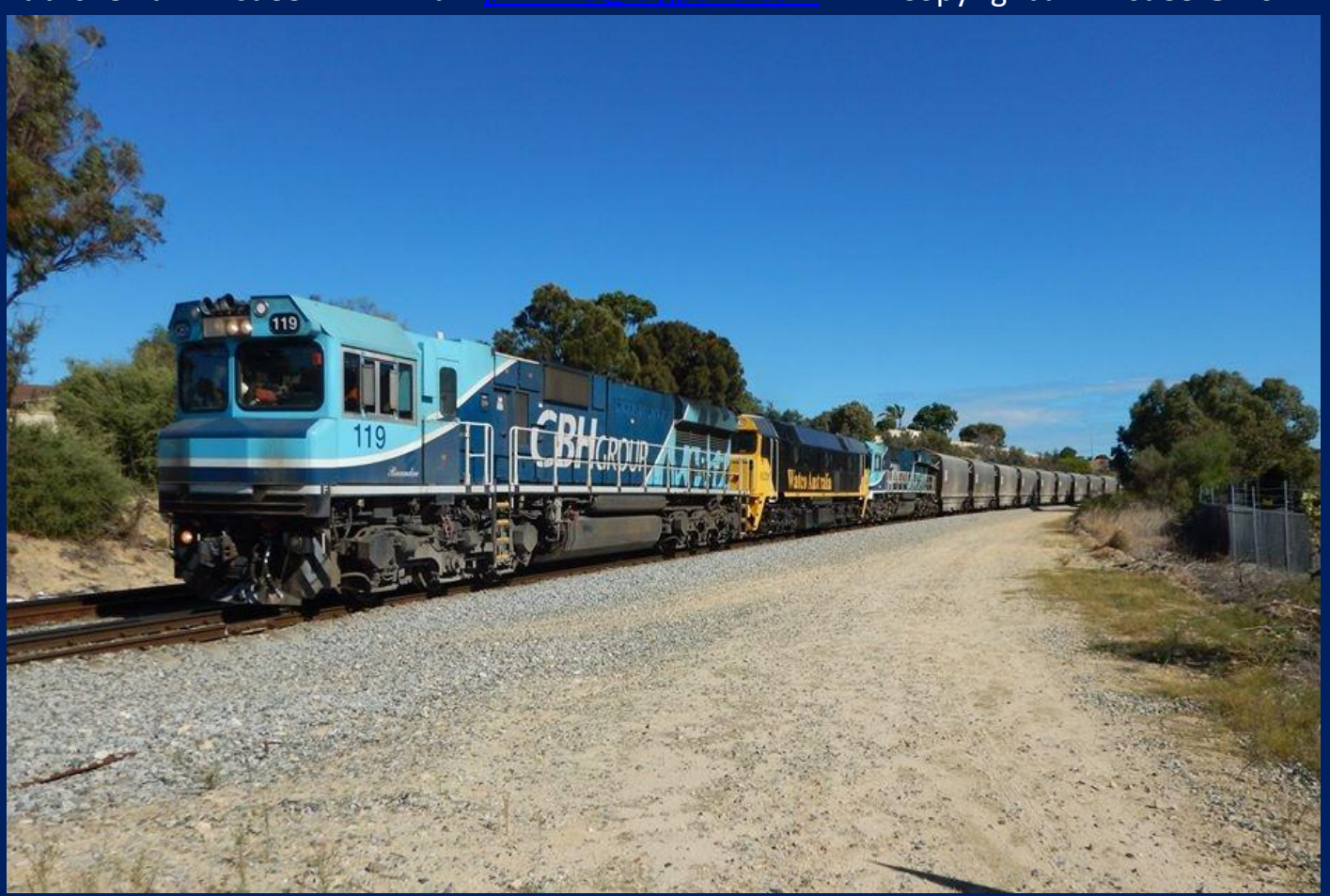
CBH119, FL220 & CBH122 on 7S55 empty Watco grain CBH Kwinana terminal to Metro Grain Centre Forrestfield to load at Bibra Lake May 20th. Photo Rodney Beard

Publisher: Jim Bisdee Email: <a href="mailto:pm1225@bigpond.com">pm1225@bigpond.com</a> Copyright Jim Bisdee © 2017