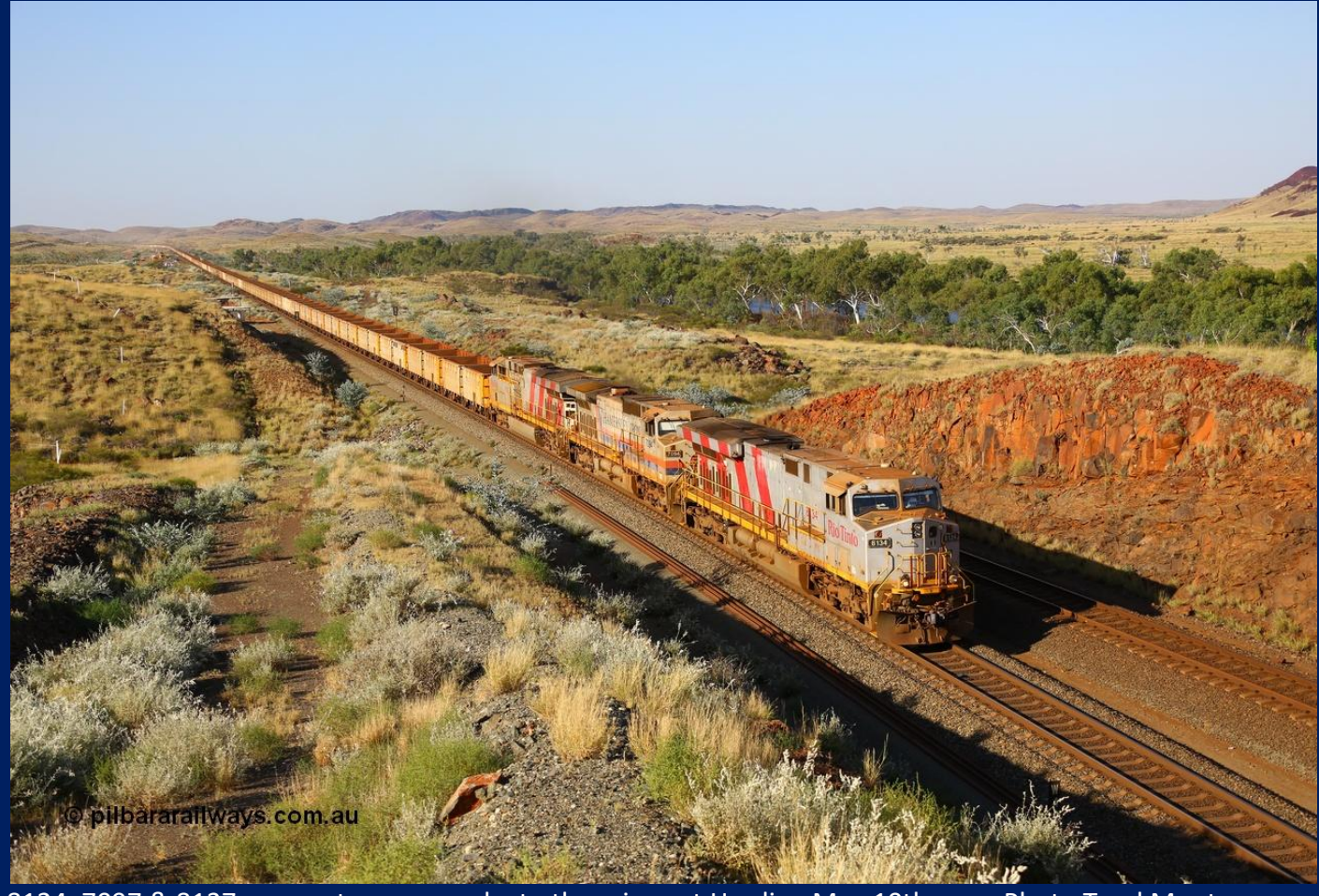
8124, 7097 & 8137 on empty ore car rake to the mines at Harding May 10th.