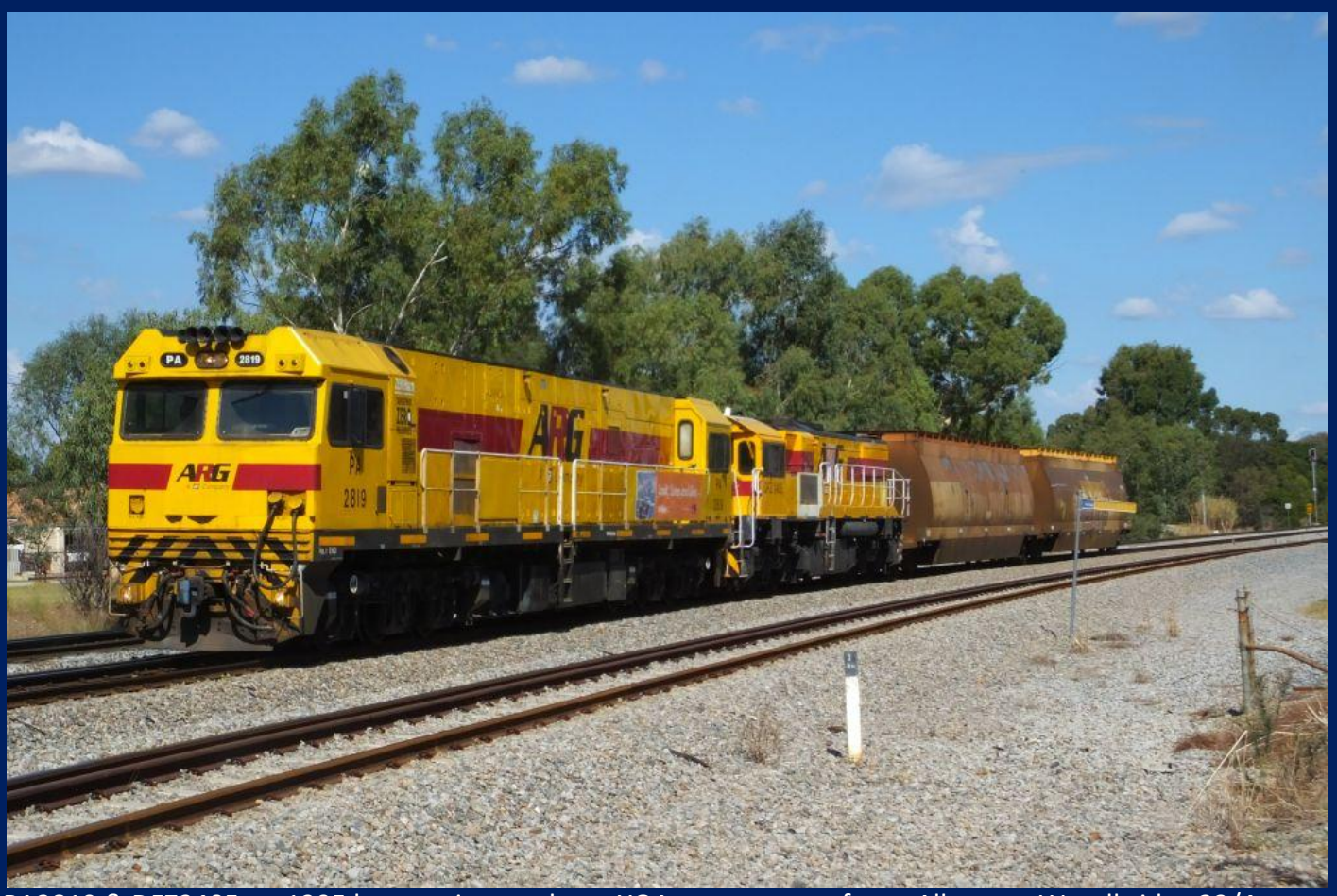
PA2819 & DFZ2405 on 1305 locomotives and two XOA wagons transfer to Albany at Woodbridge 23/4.