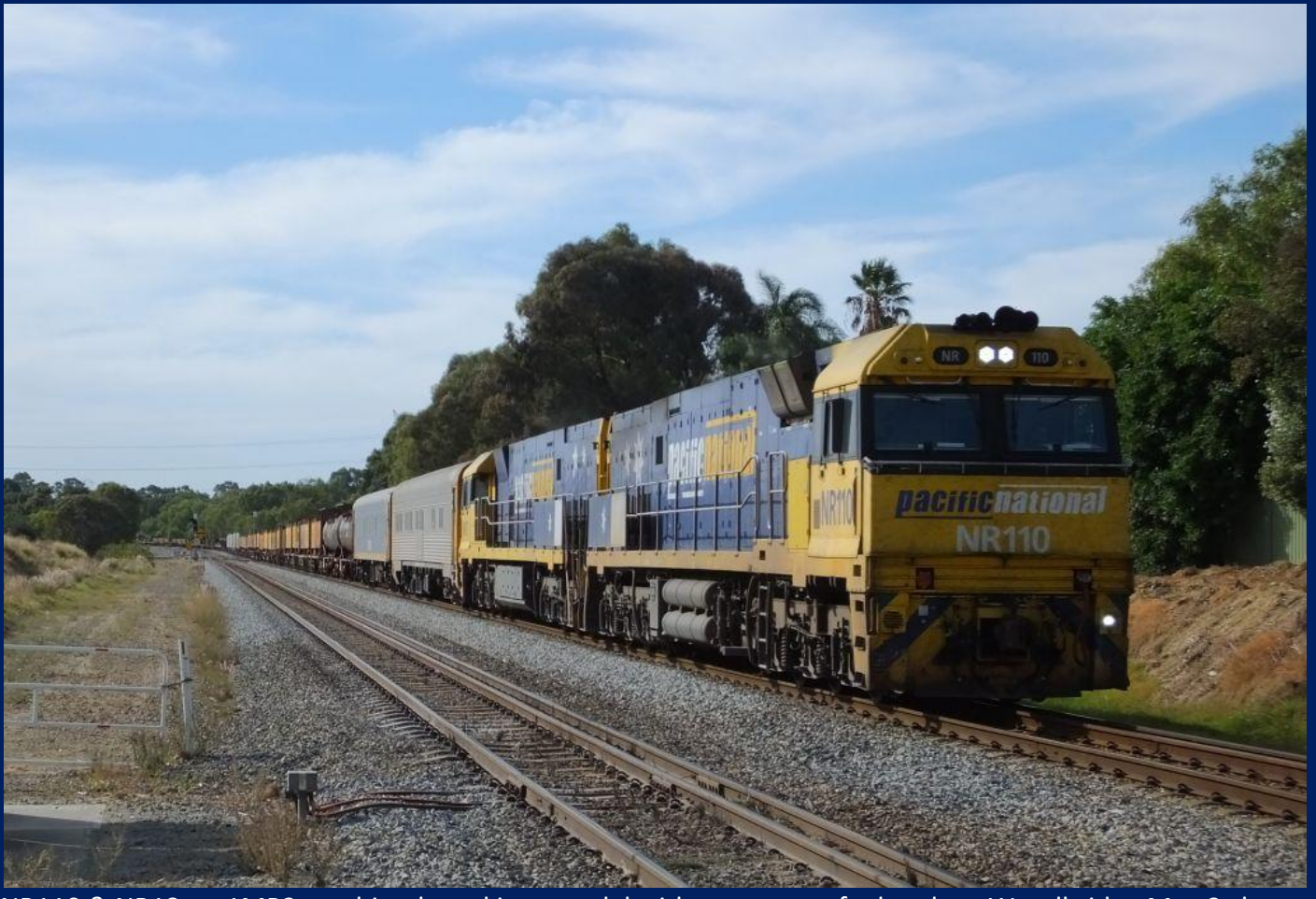
NR110 & NR13 on 1MP2 combined steel intermodal with two empty fuel tankers Woodbridge May 3rd.