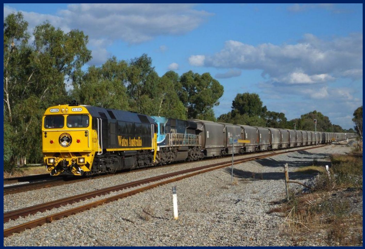
FL220 & CBH120 on 4S57 empty Watco grain Woodbridge May 10th.