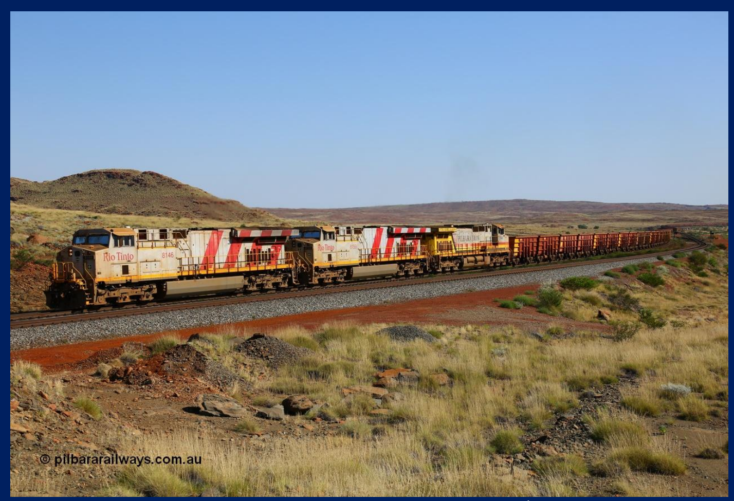
8146, 8159 & 7049 haul empty off Cape Lambert line up 1.68% grade Emu 10/5.