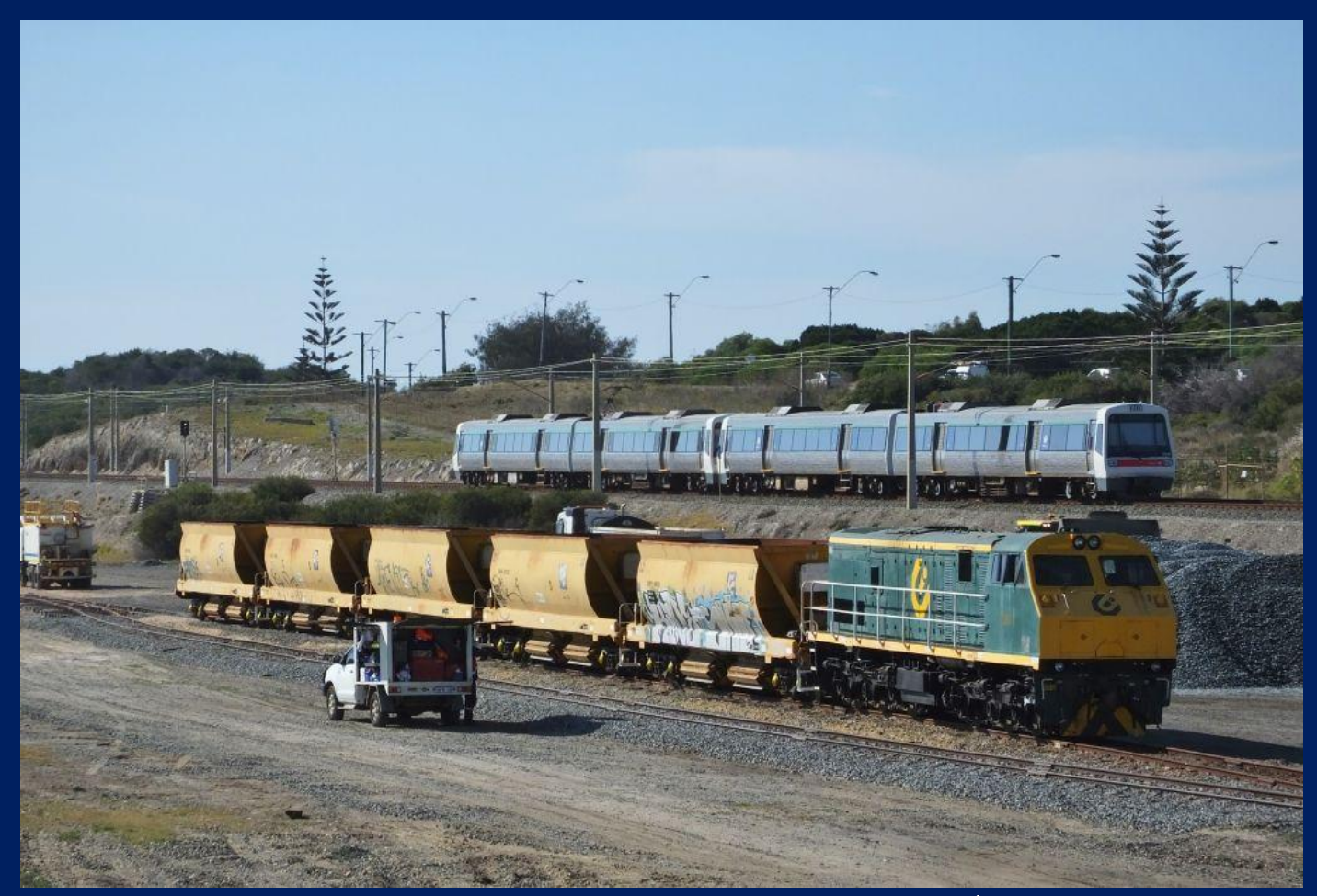
PTA U20CM U201 stabled on ballast train at Leighton siding bypassed by EMU 1/5.