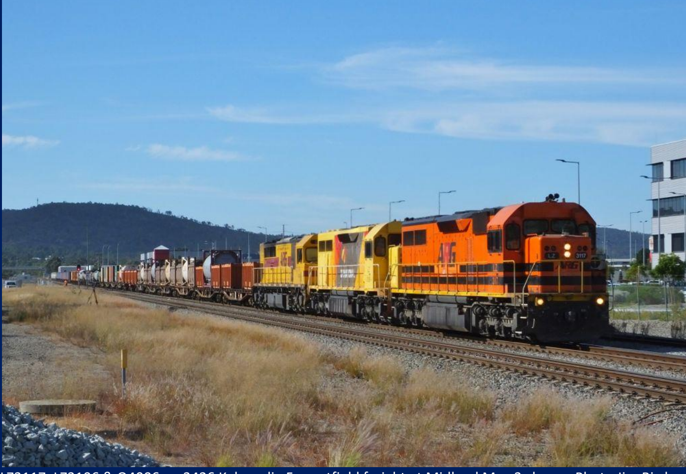
LZ3117, LZ3106 & Q4006 on 3426 Kalgoorlie Forrestfield freight at Midland May 3rd.