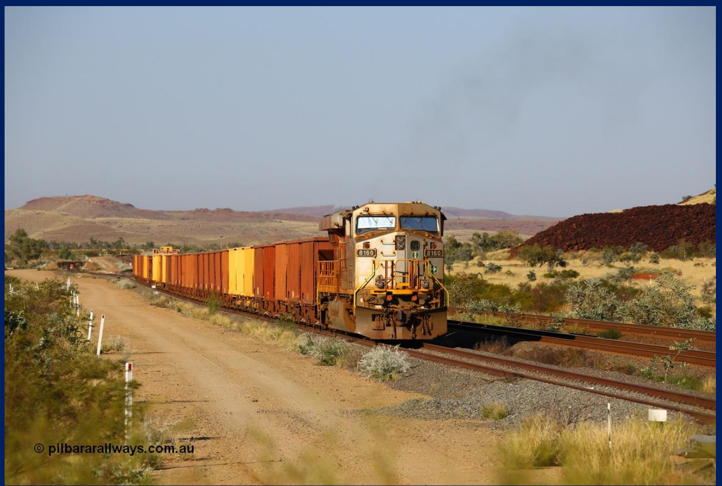
ES44DCi 8150 on ballast train on back track at Green Pool siding May 10th.