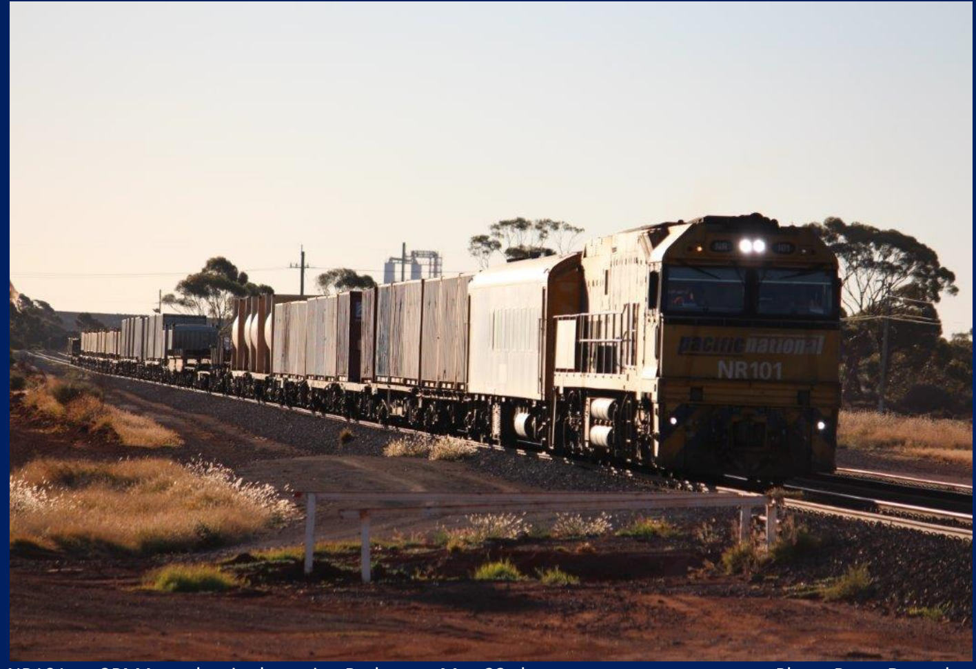
NR101 on 3PM4 steel train departing Parkeston May 23rd.