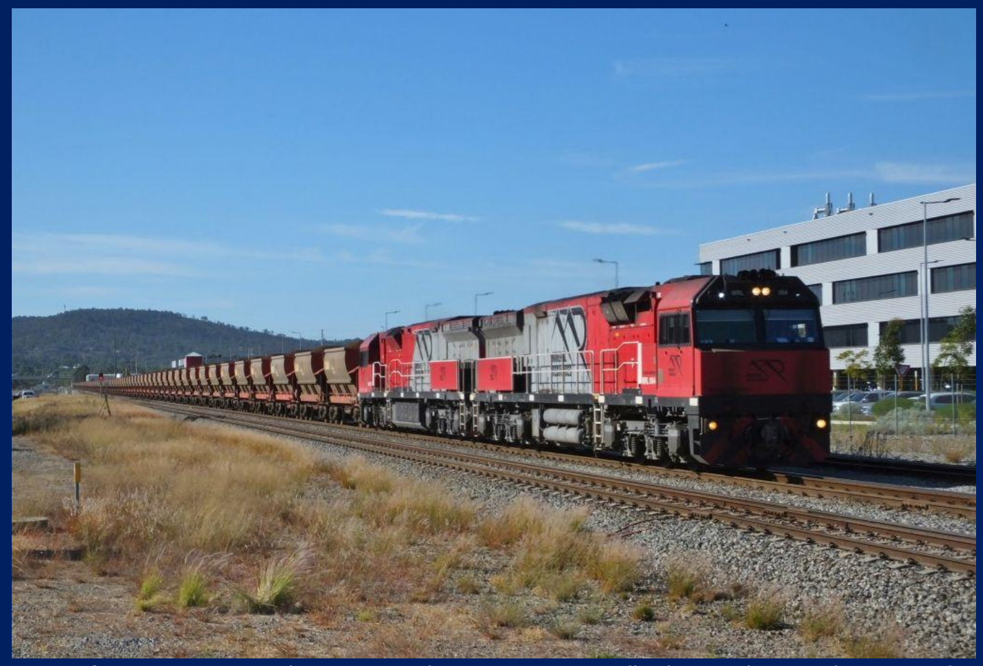
MRL004 & MRL006 on 3030 Polaris ore Mt Walton to Kwinana at Midland May 3rd.