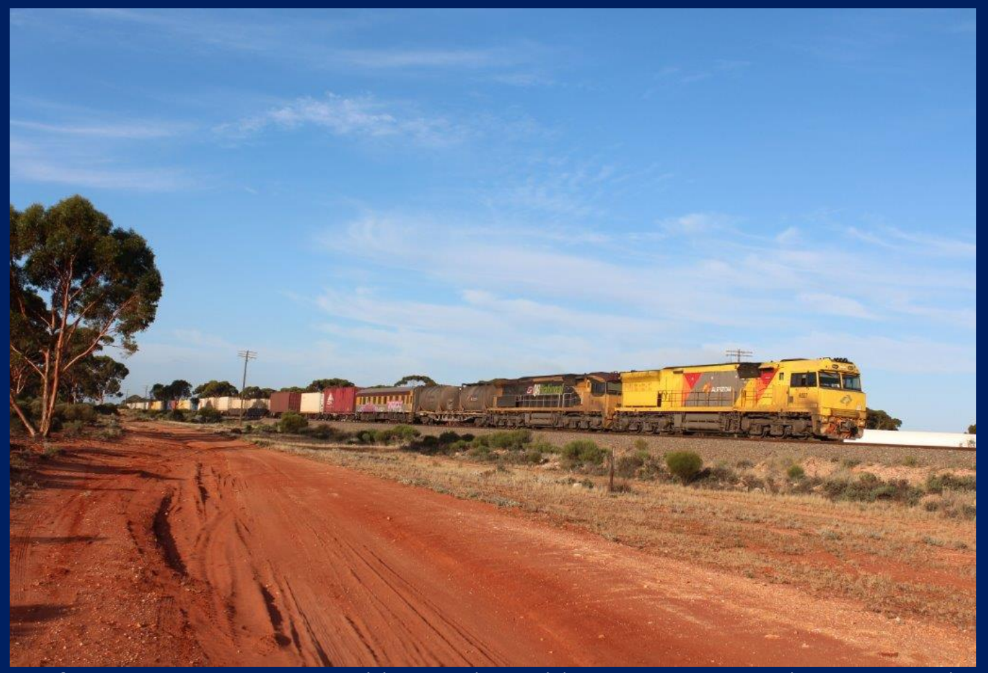
6027 & 6010 on 7MP1 Aurizon intermodal running thru Binduli May 1st.