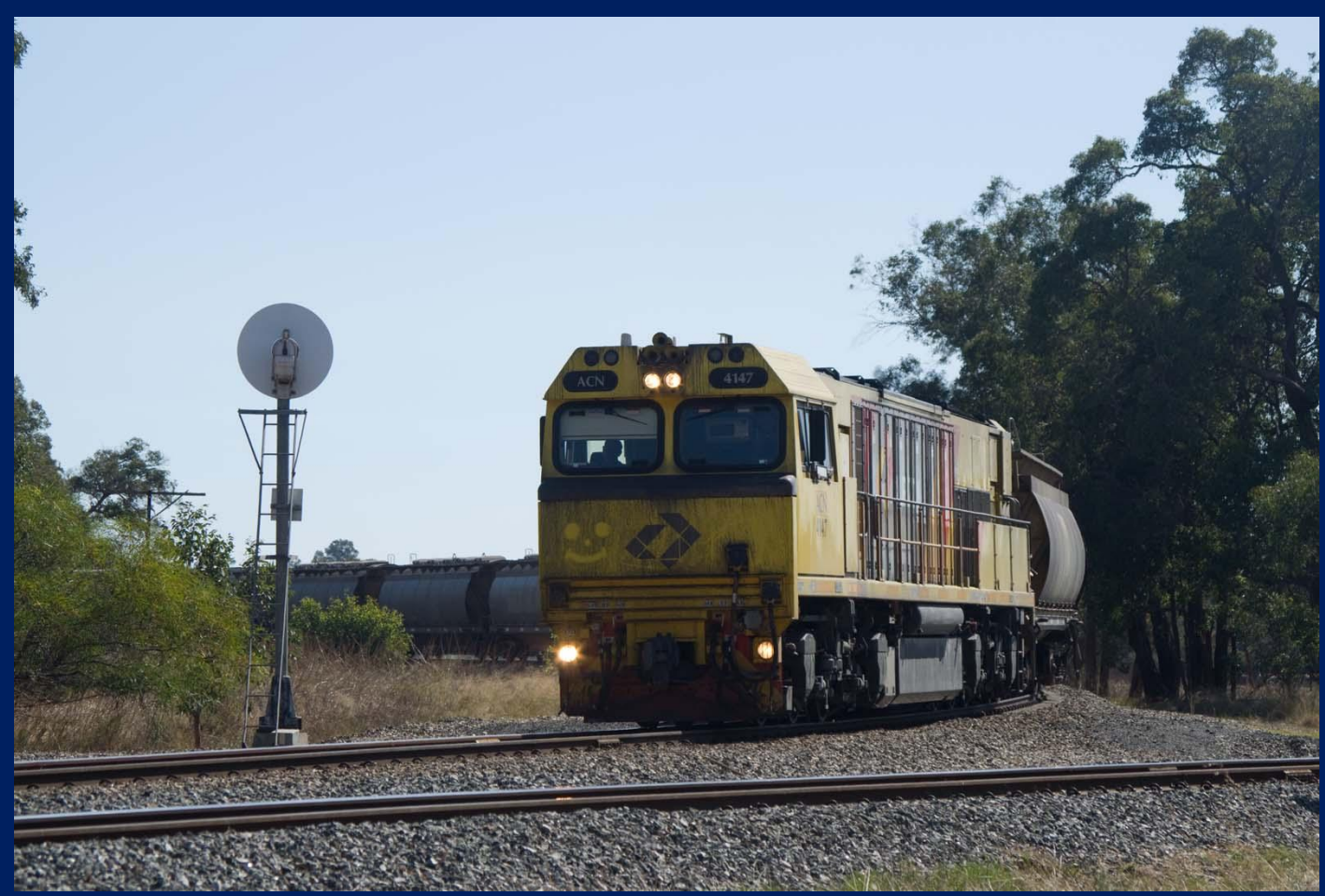
ACN4147 on 5874 empty alumina Bunbury to Calcine at Pinjarra East April 20th.