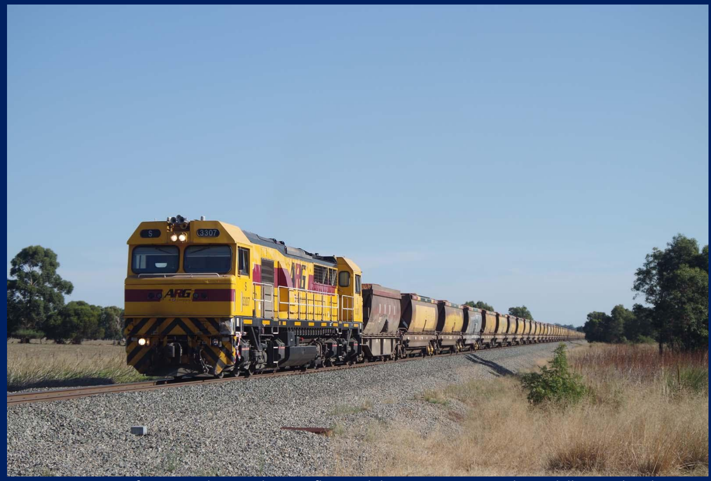
S3307 on 5964 XGF former coal wagon bauxite fleet with last XBC wagon North Dandallup April 20th.