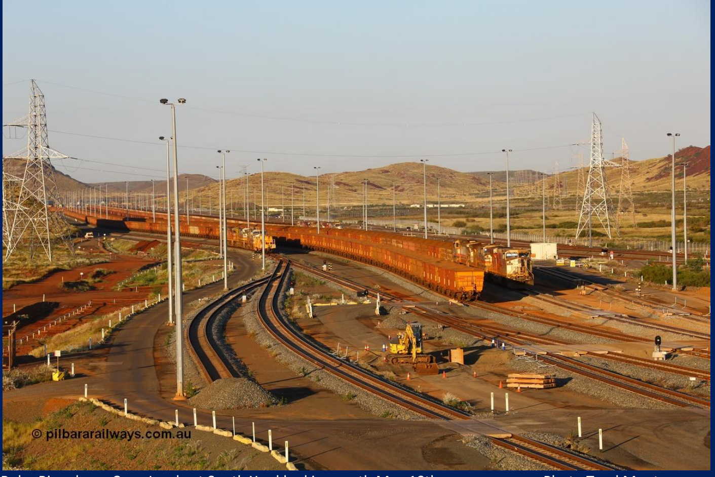
Robe River huge Cape Lambert South Yard looking south May 10th.