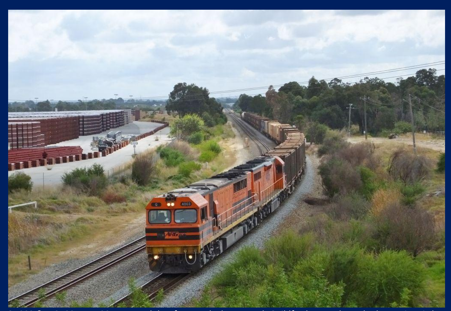
Q4003 & LZ3109 on 4430 empty sulphur from Malcolm at south Guildford May 4th.