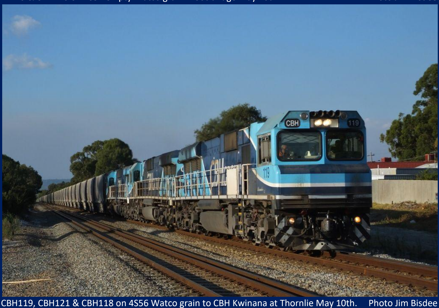
CBH119, CBH121 & CBH118 on 4S56 Watco grain to CBH Kwinana at Thornlie May 10th.