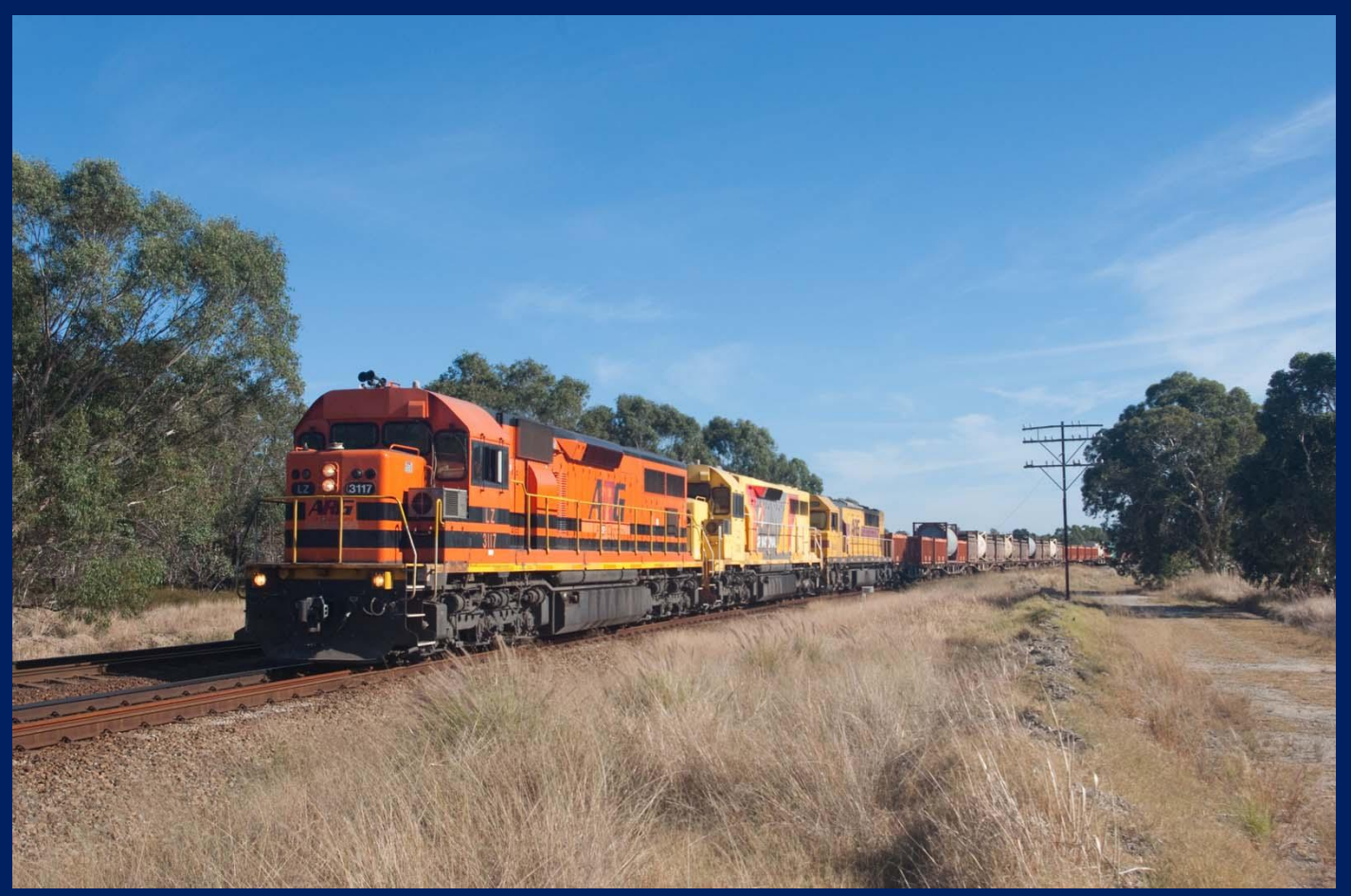
LZ3117, LZ3106 & Q4006 on 3426 Kalgoorlie Forrestfield freight Middle Swan May 3rd.