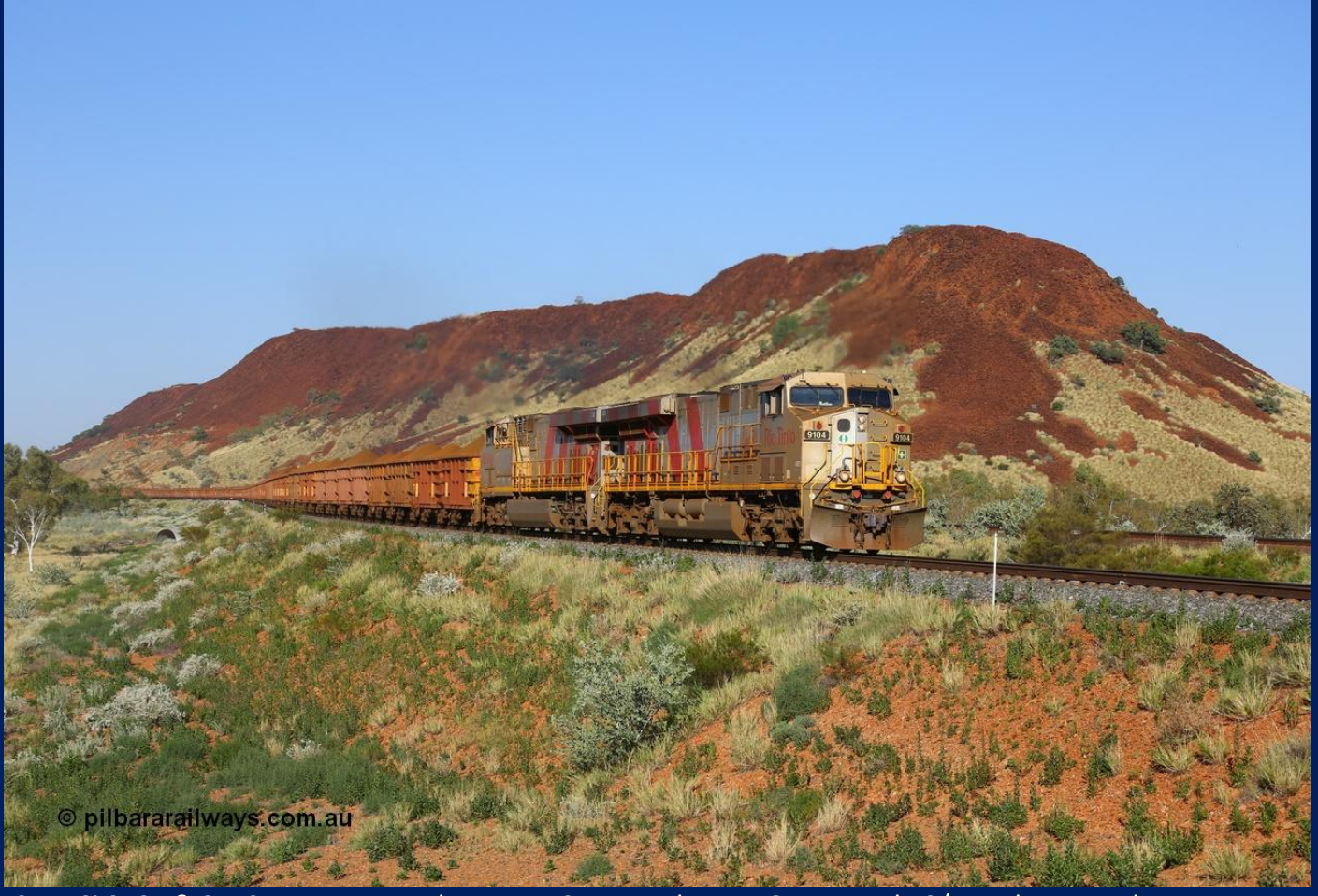
ES44ACi 9104 & 9119 on West Angelas ore to Cape Lambert at Green Pool 10/5.