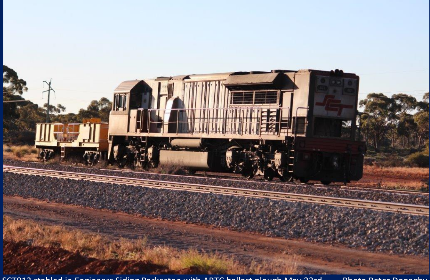
SCT012 stabled in Engineers Siding Parkeston with ARTC ballast plough May 23rd.