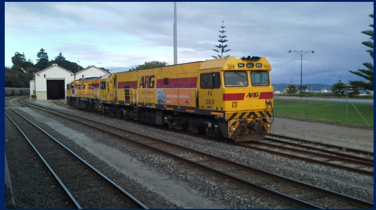
PA2819 & DFZ2405 heading to loco shed Albany May 9th.