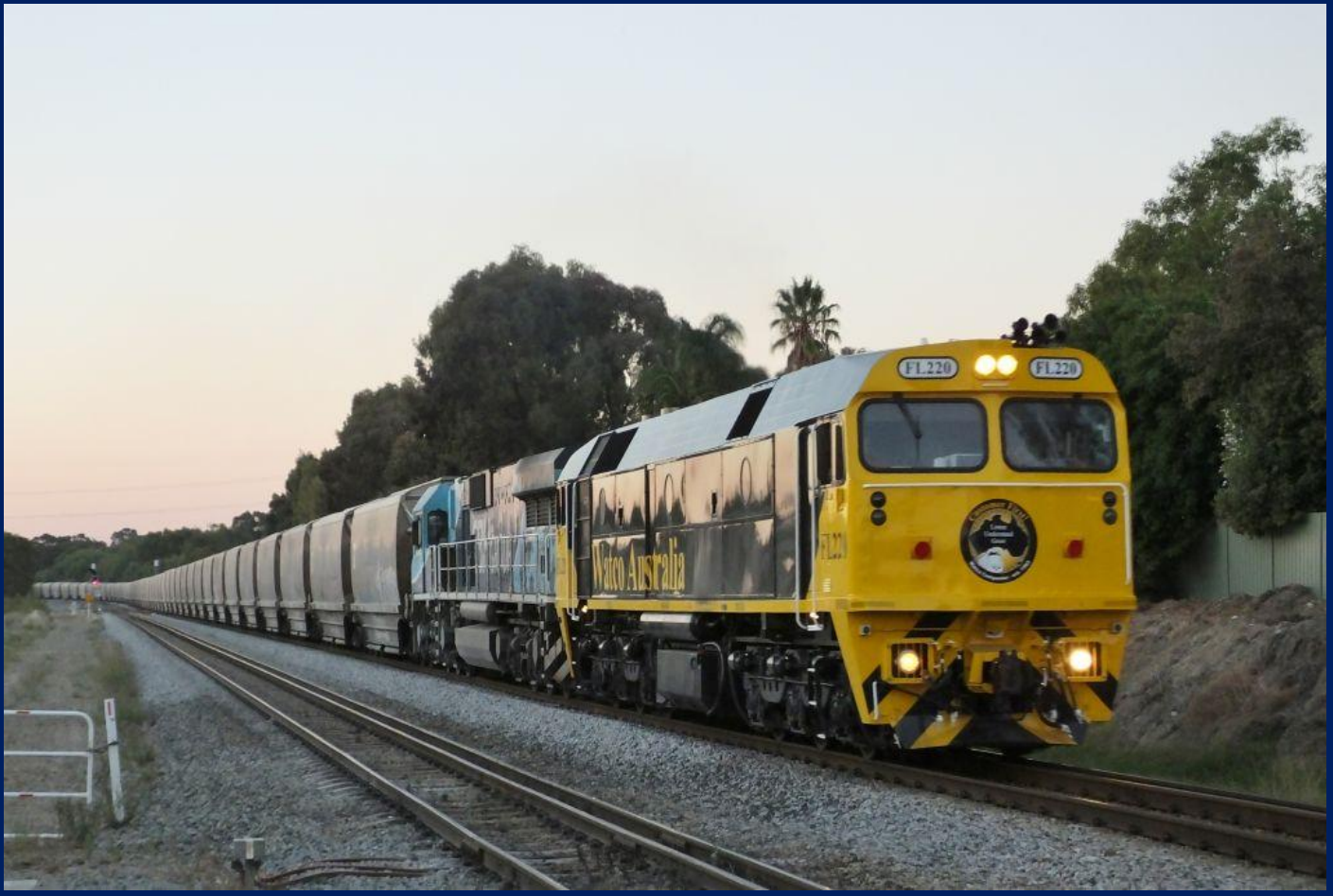
FL220 & CBH119 on 7S56 Watco grain with first use of FL220 on CBH grain train at Hazelmere May 6th.