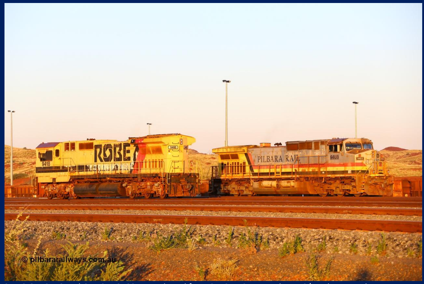
CM40-8M 9418 and C44-9W 9403 renumbered from 9472 at Cape Lambert 10/5.