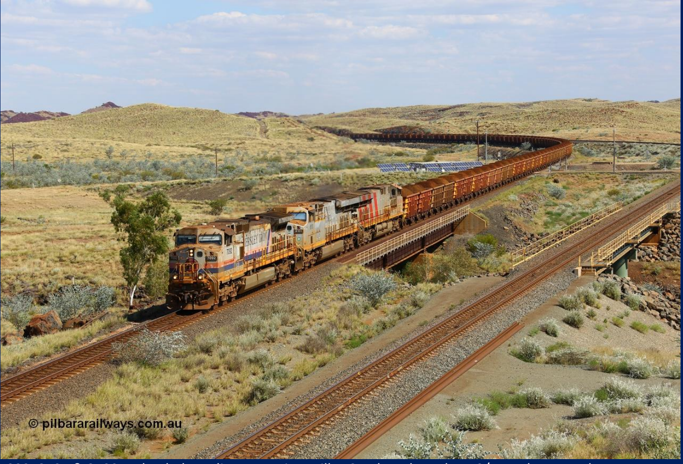
7092, 8101 & 8190 on loaded Yandi ore crossing Miller Creek at the 45km 10/5.