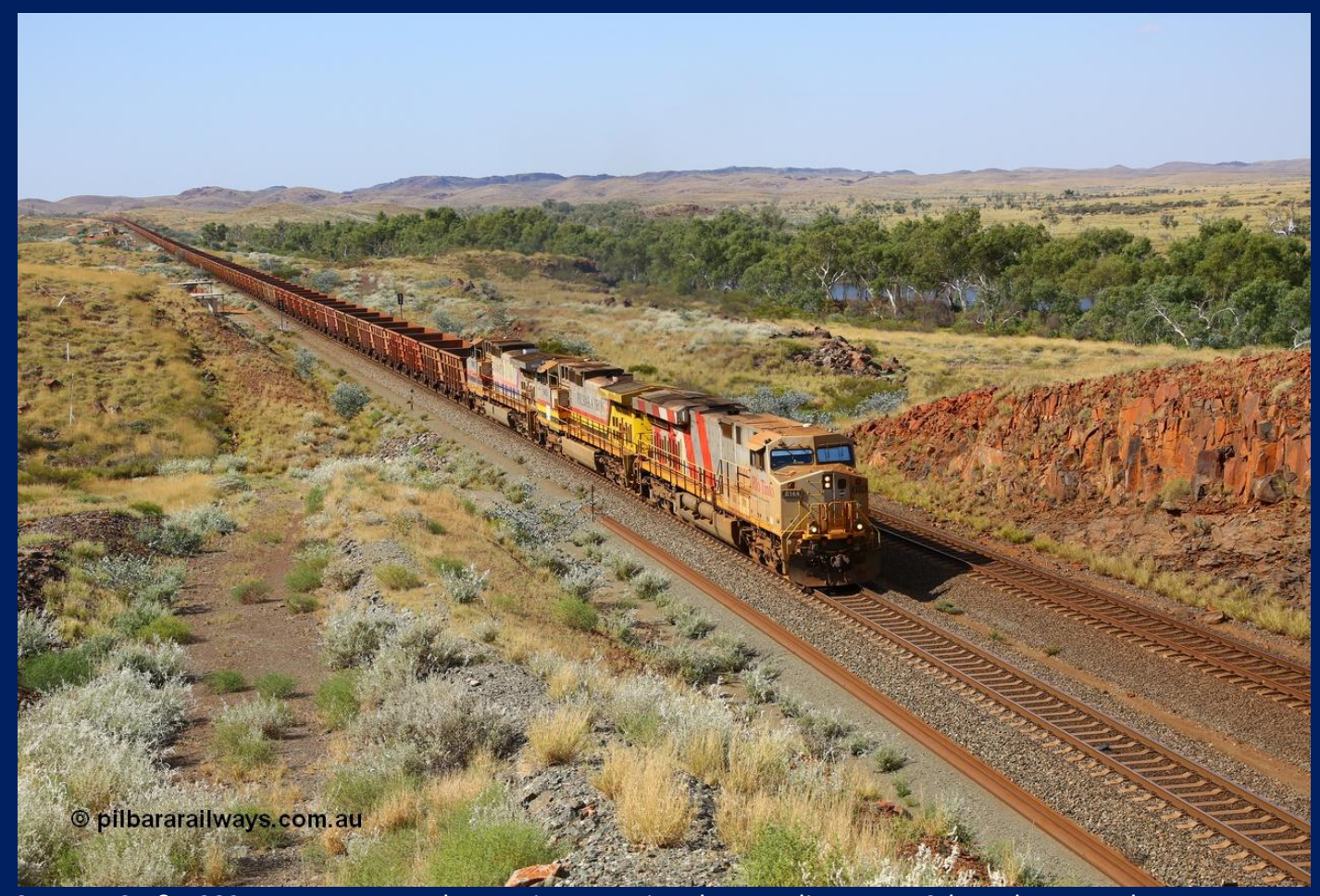
8144, 7435 & 7082 on empty ore rake to mines running thru Harding May 10th.