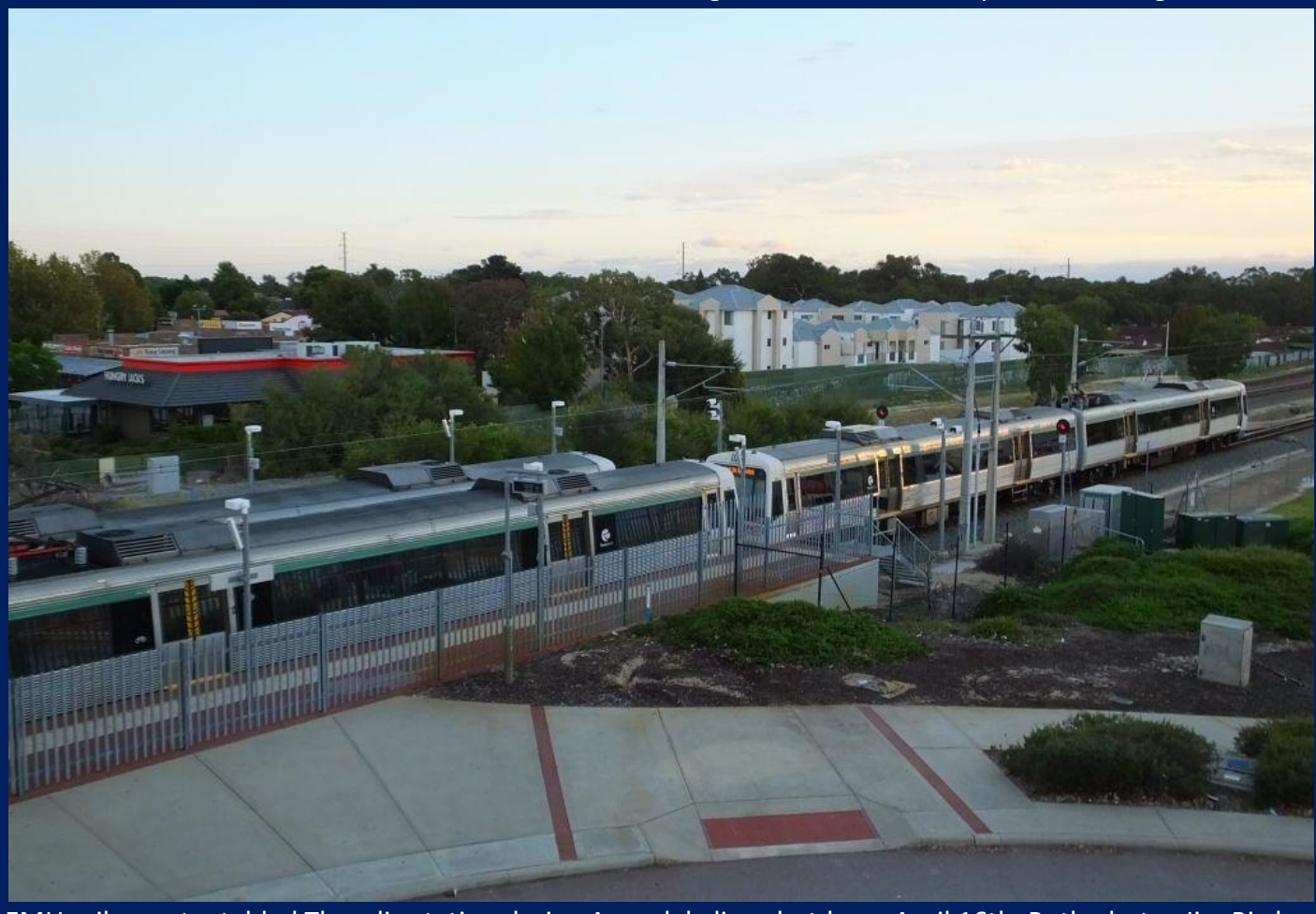
EMU railcar sets stabled Thornlie station during Armadale line shutdown April 16th.