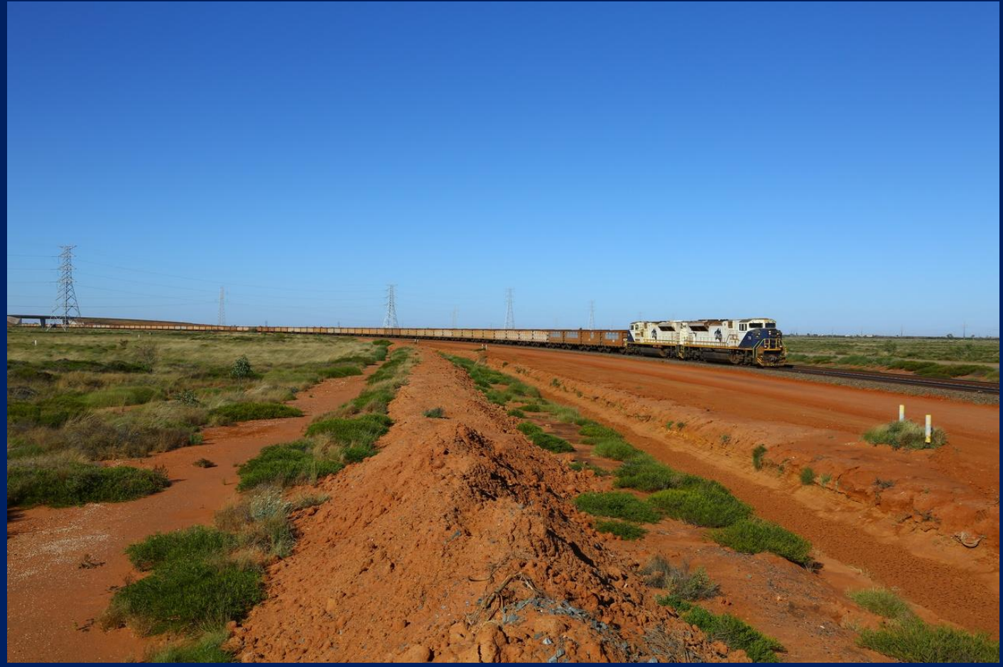
FMG SD70Ace 719 & 704 on loaded ore around 5km curve July 30th.