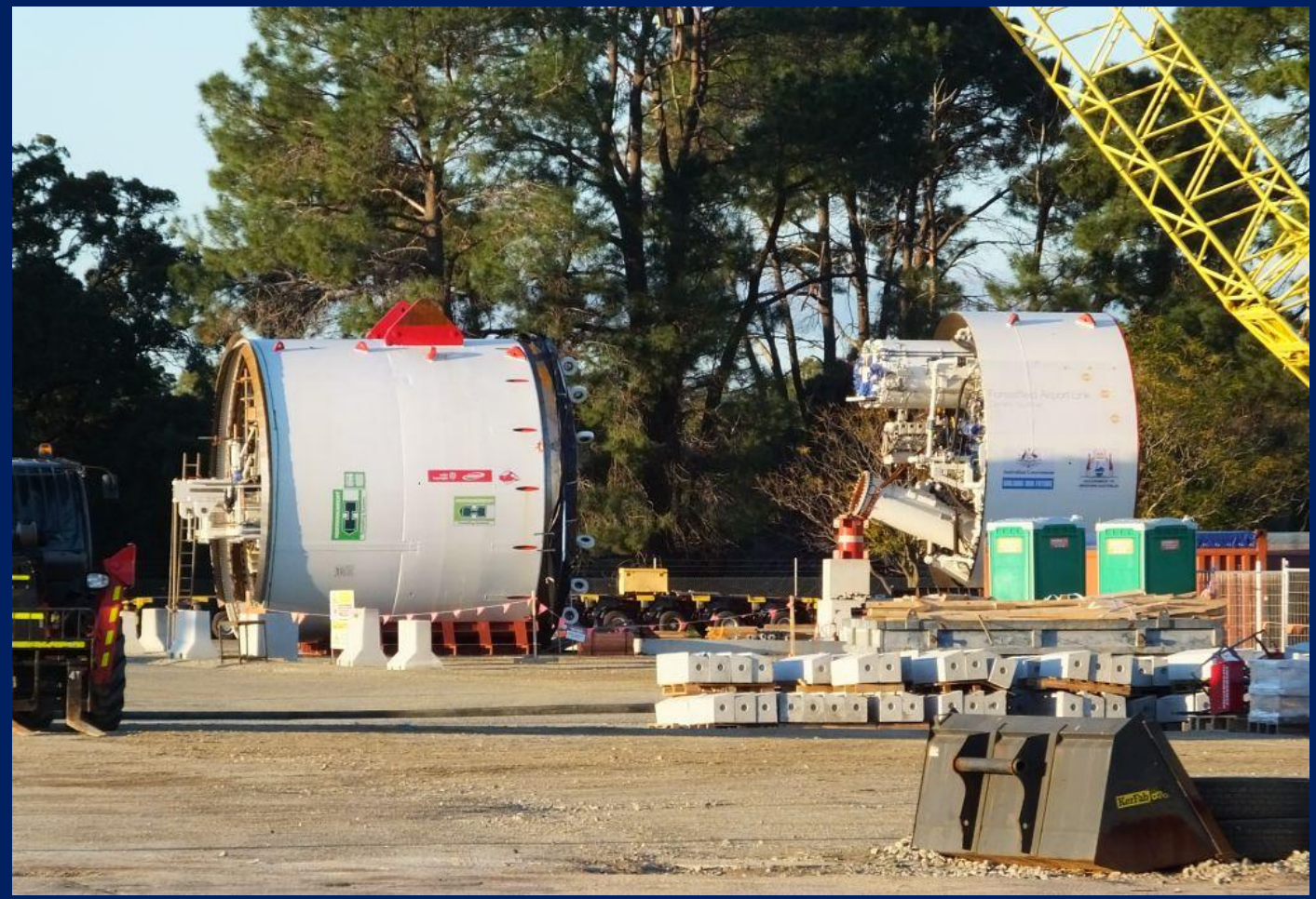
Tunnel Boring Machine for Forrestfield line being prepared to commence work 8/7.