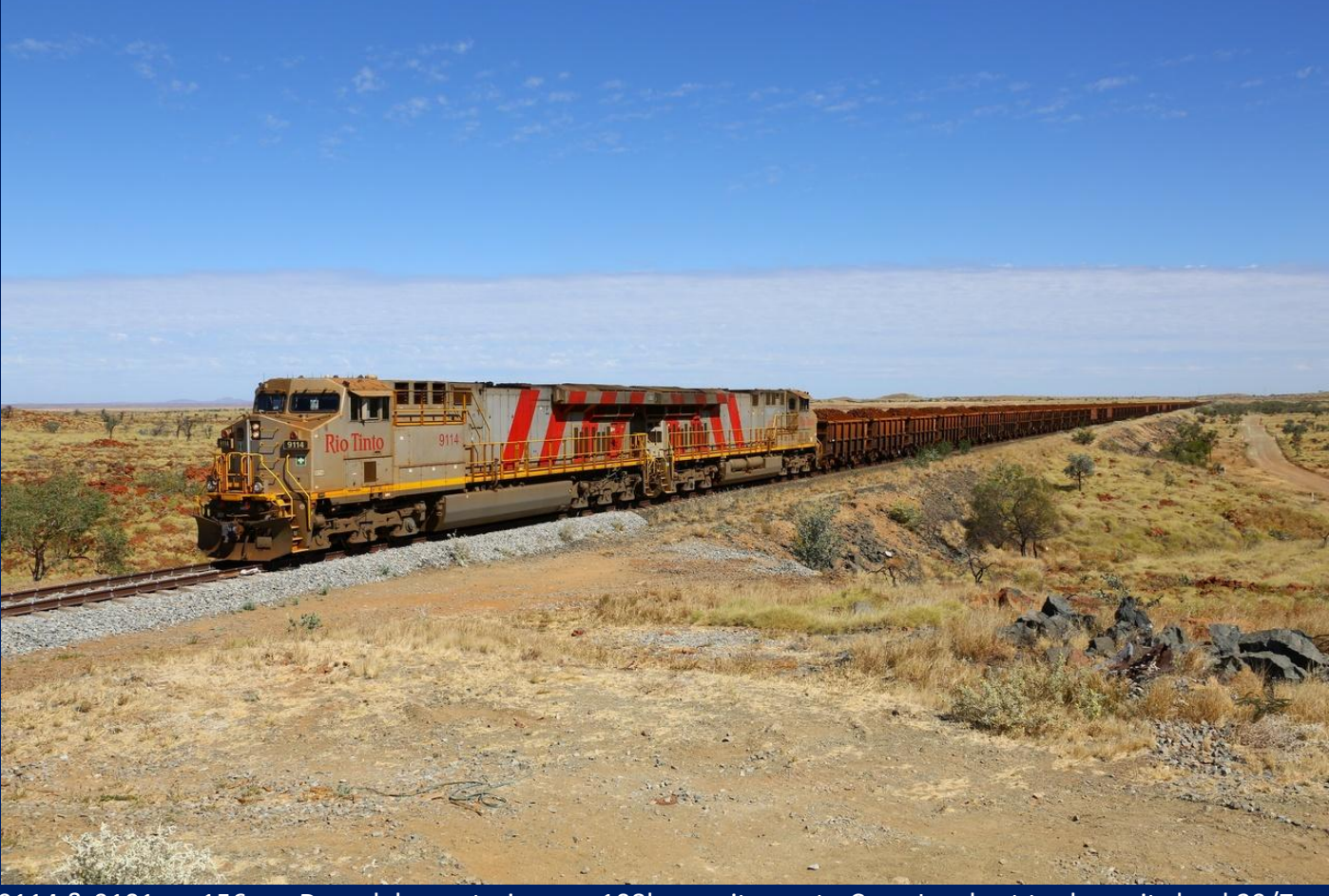
9114 & 9101 on 156 car Deepdale ore train near 108km on its run to Cape Lambert to dump its load 29/7.