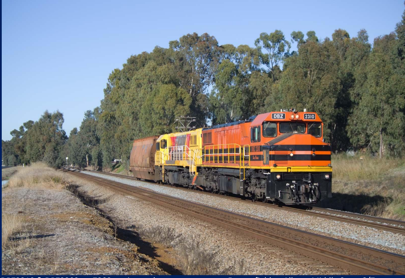
DBZ2310 & DBZ2309 on 7303 engine and wagon movement Forrestfield to Albany Middle Swan 8/7.