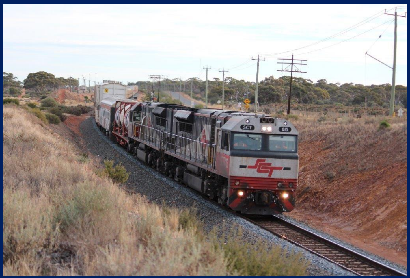
SCT015 & SCT run late 3PG1 out of West Kalgoorlie July 19th.