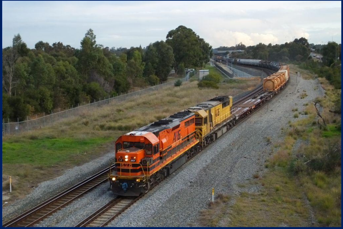
LZ3107 & Q4017 on 3025 Kwinana to Forrestfield shunter at Kenwick July 4th.