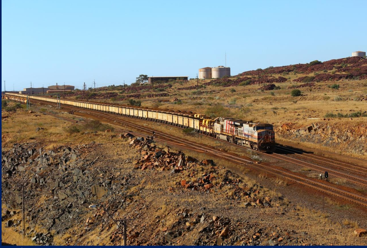
7069 & 8195 on empty car rake Parker Point to 7 Mile July 29th.