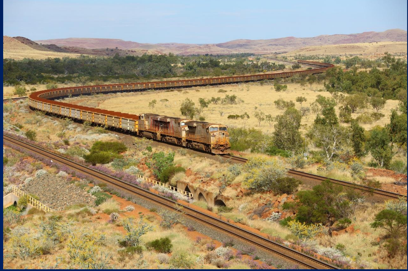
8114, 8120 & 8148 on Rio ore train at 67.3km Robe River line 29/7.