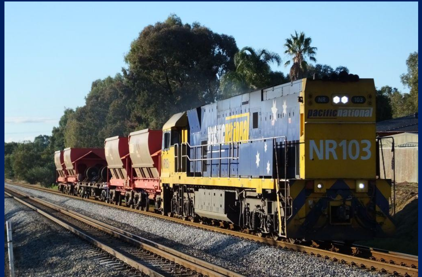
NR103 on 7P16 wagon recovery train ex Jumperkine to PFT at Hazelmere July 8th.