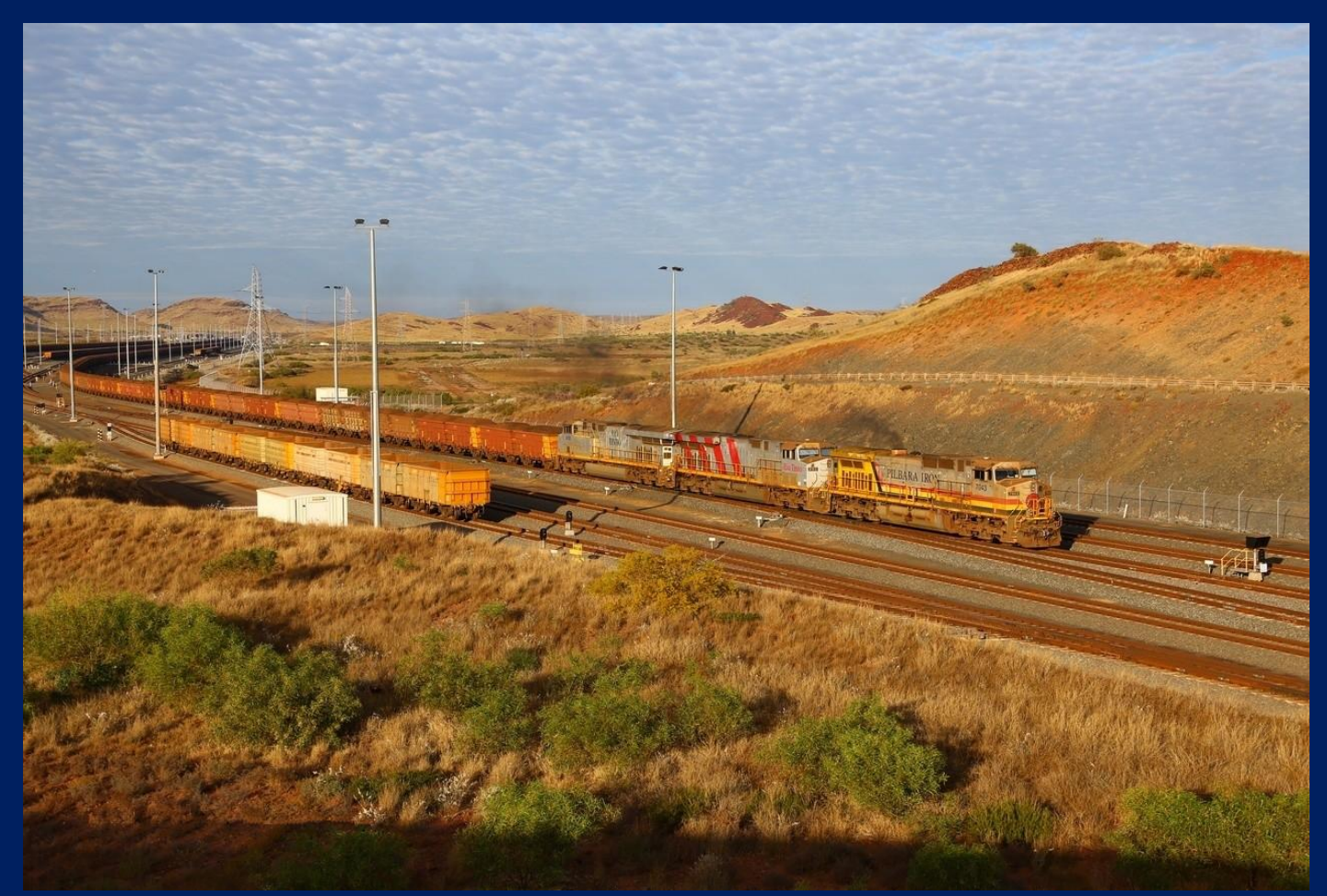
7043, 8153 & 8107 on 236 car Rio Ore train on approach to car dumper 7 Cape Lambert Yard July 29th.