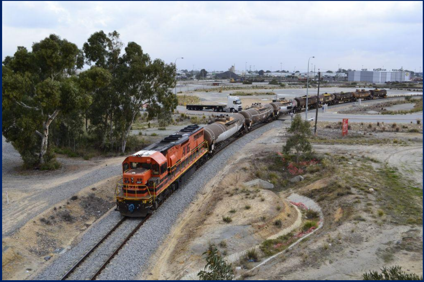
LZ3107 on 4SG4 tankers ex BP terminal Kewdale to Forrestfield July 12th.