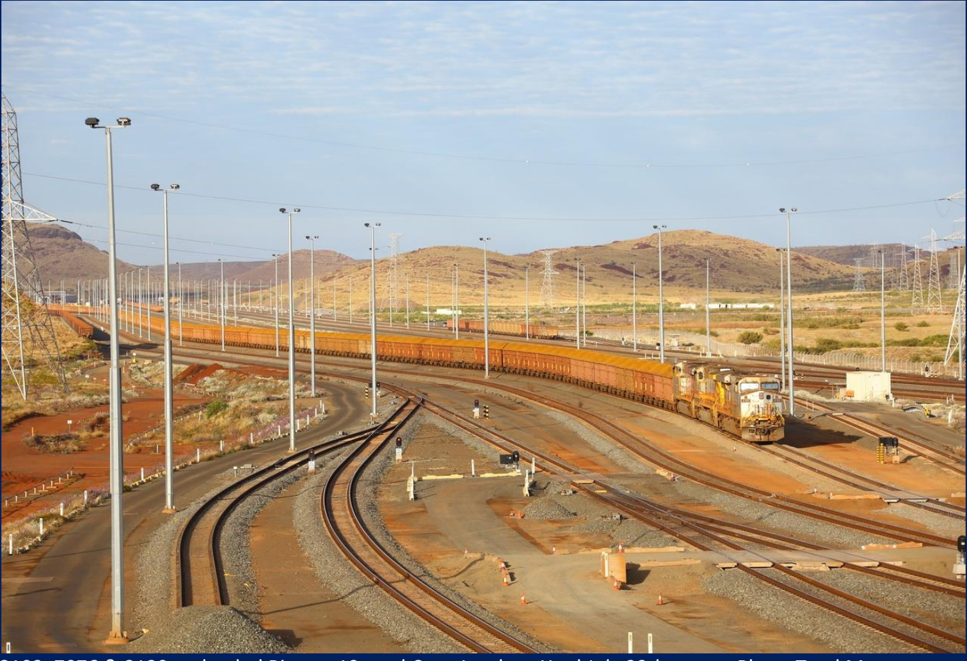
8103, 7076 & 8129 on loaded Rio ore 19 road Cape Lambert Yard July 29th.