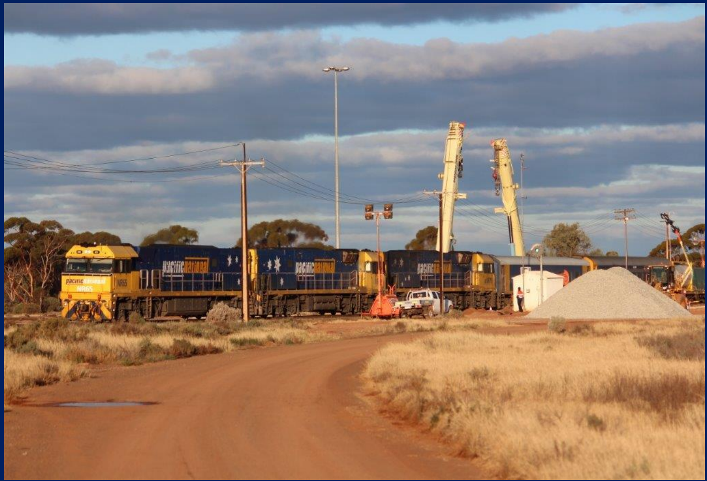
NR65, NR59 & NR79 on 3MP5 crawl over newly laid points at Parkeston July 6th.