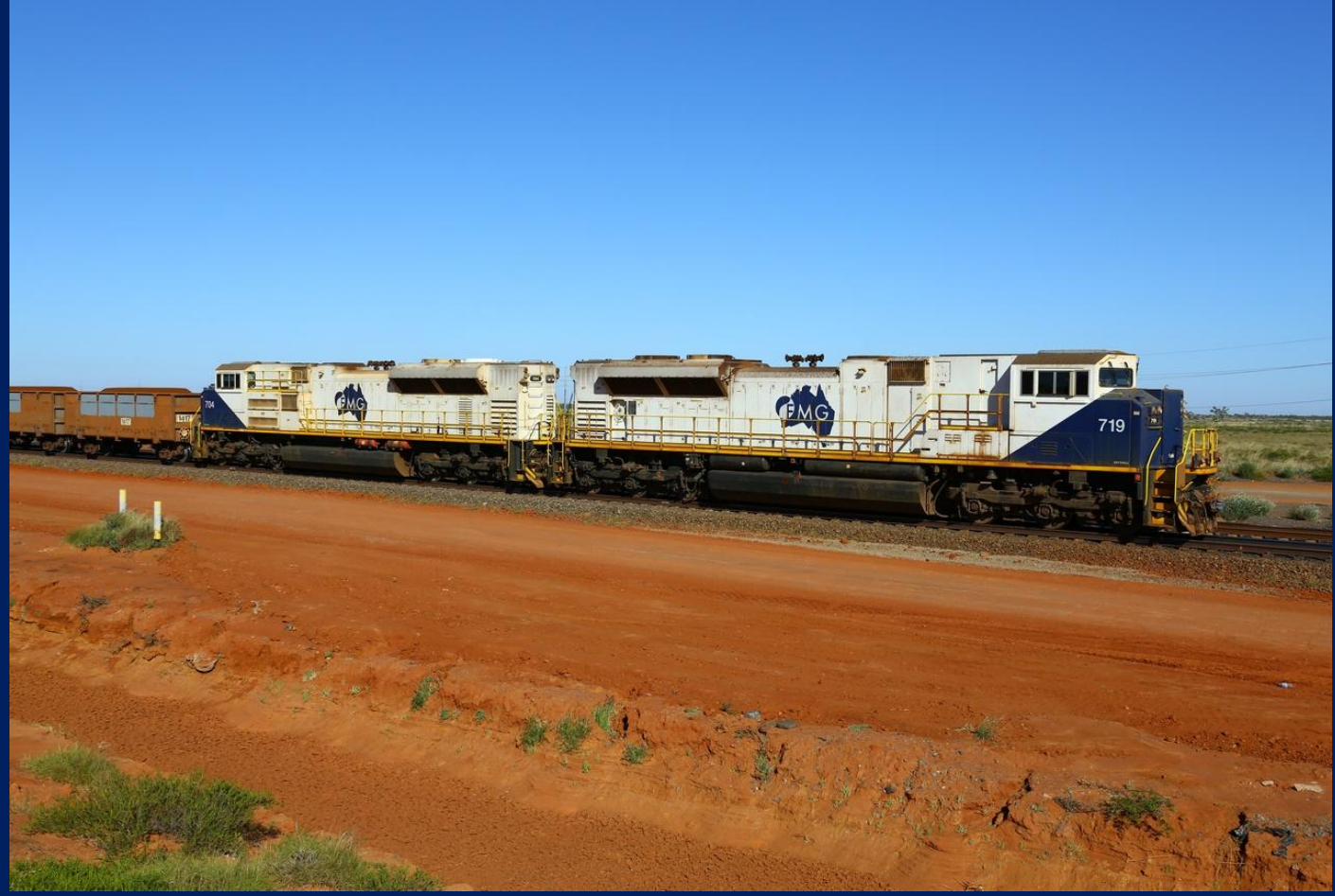
FMG 719 and 704 on loaded ore about 5km Boodarie July 30th.