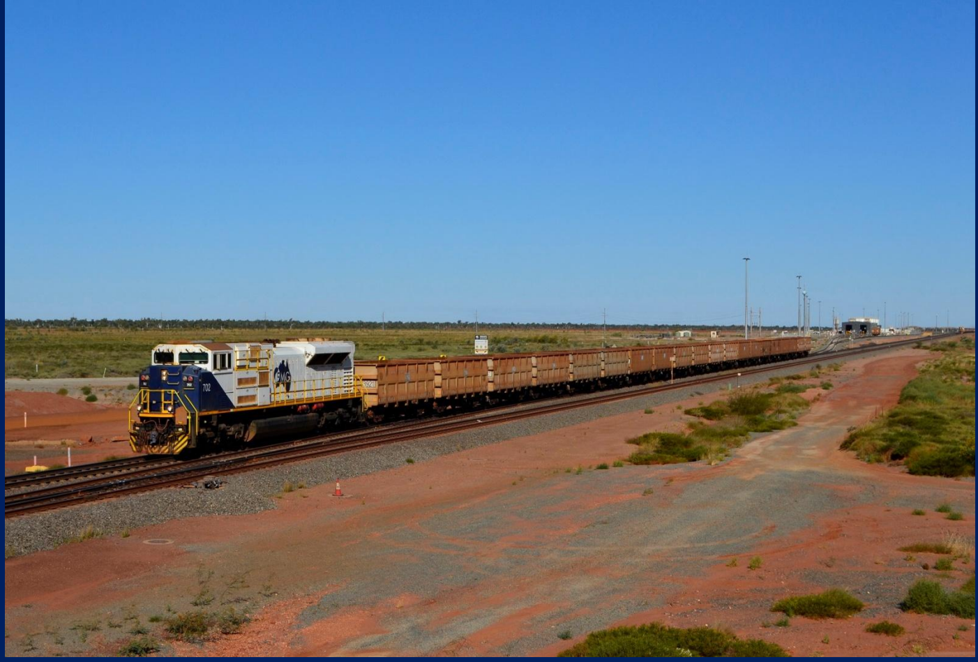
702 shunts short empty rake of ore cars out of Kanyiri Yard to turn on the port balloon loop 26/7.