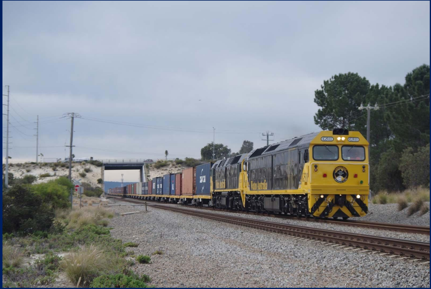
G511 & HL203 on 2142 ILS/Watco port shuttle Jandakot July 10th.