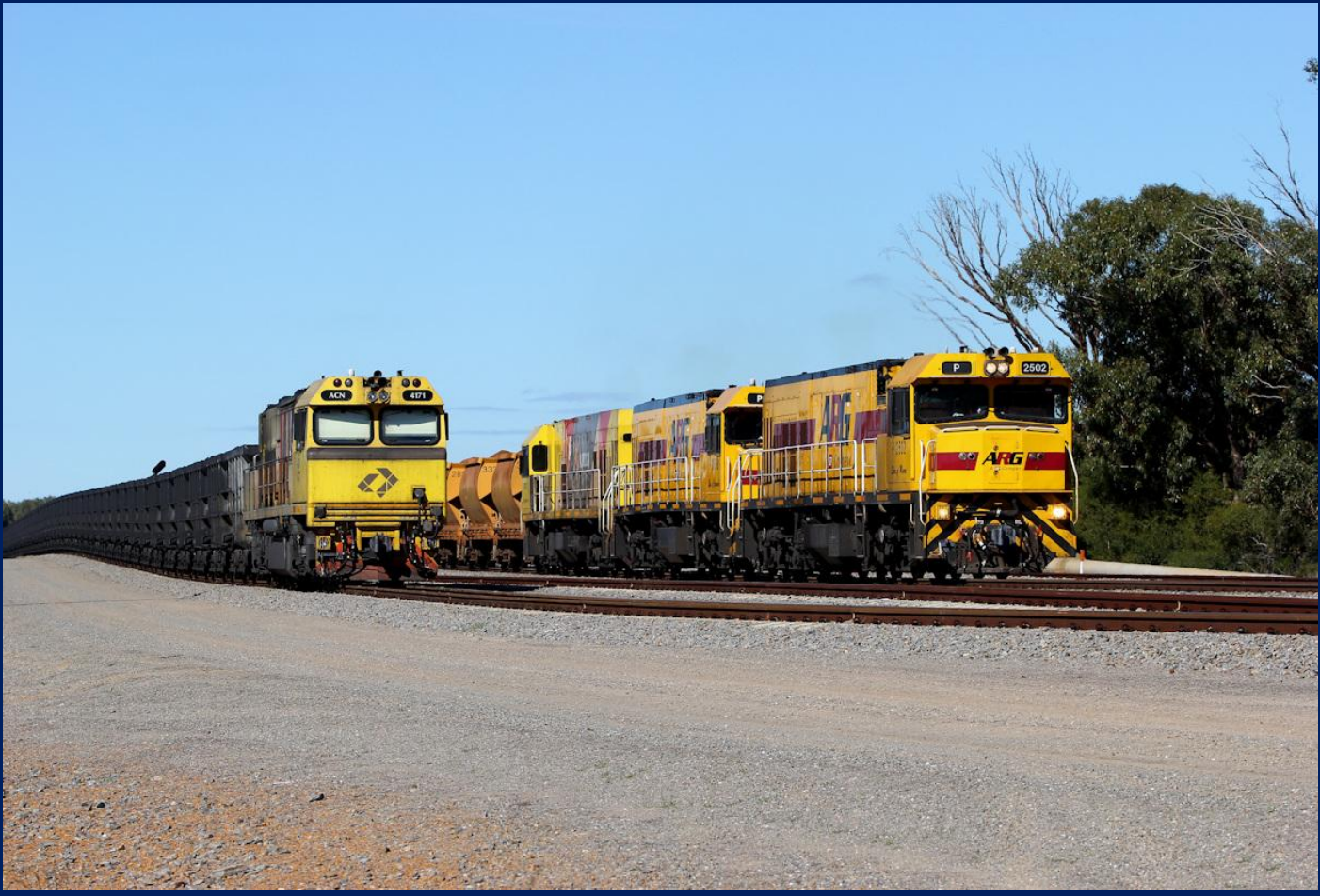
ACN4071 DPU on Karara set, P2502, P2508 & P2517 on Mt Gibson ore Narngulu July 9th.