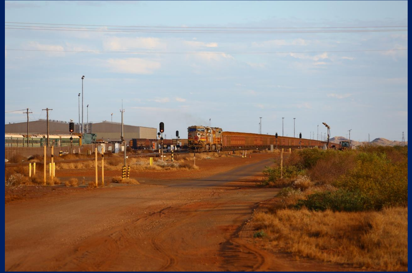
7044, 8134 & 9407 on loaded ore to East Intercourse Island pass preserved Alco 3107 at 6 Mile 29/7.