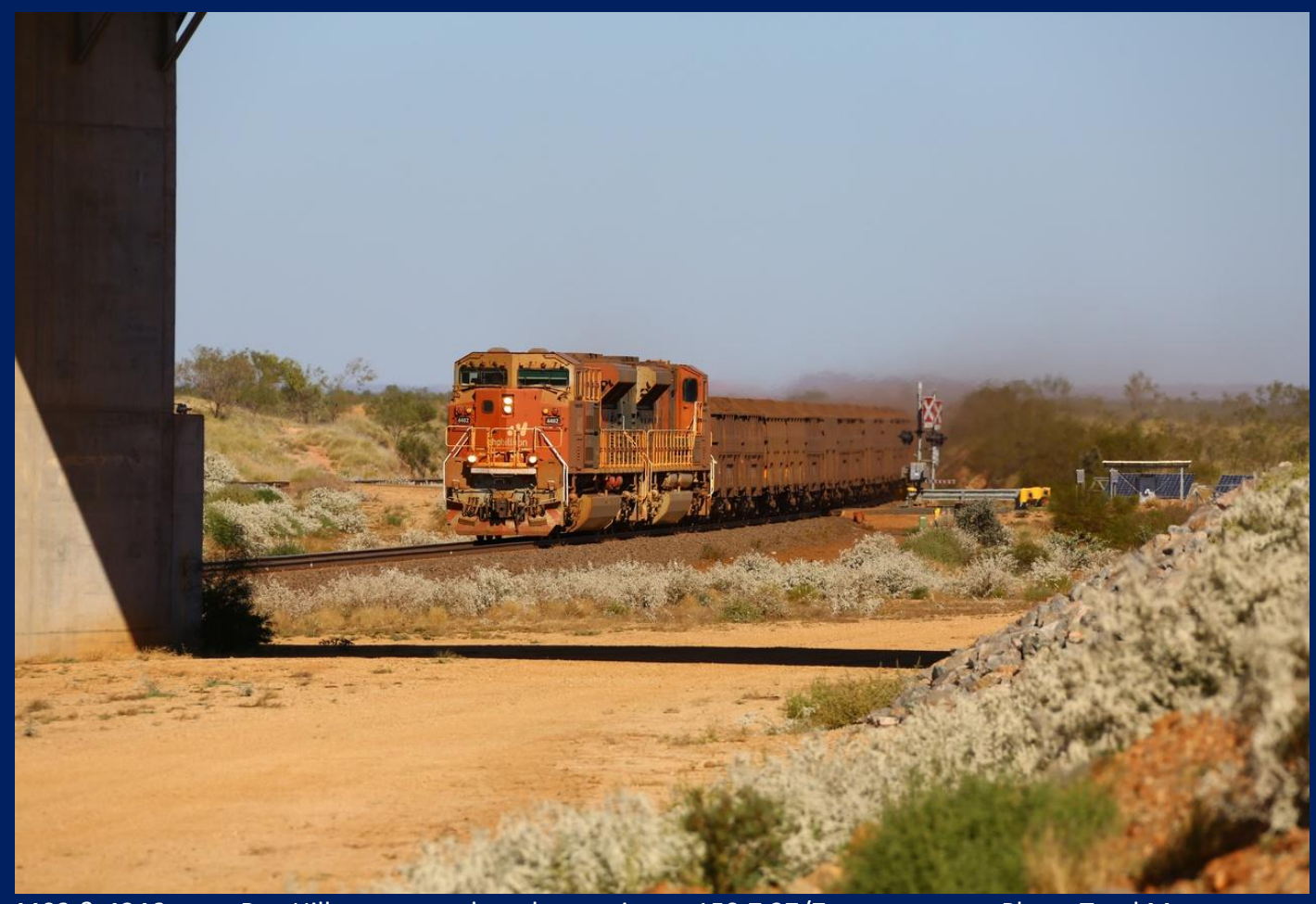
4402 & 4346 cross Roy Hill access road grade crossing at 159.7 27/7.