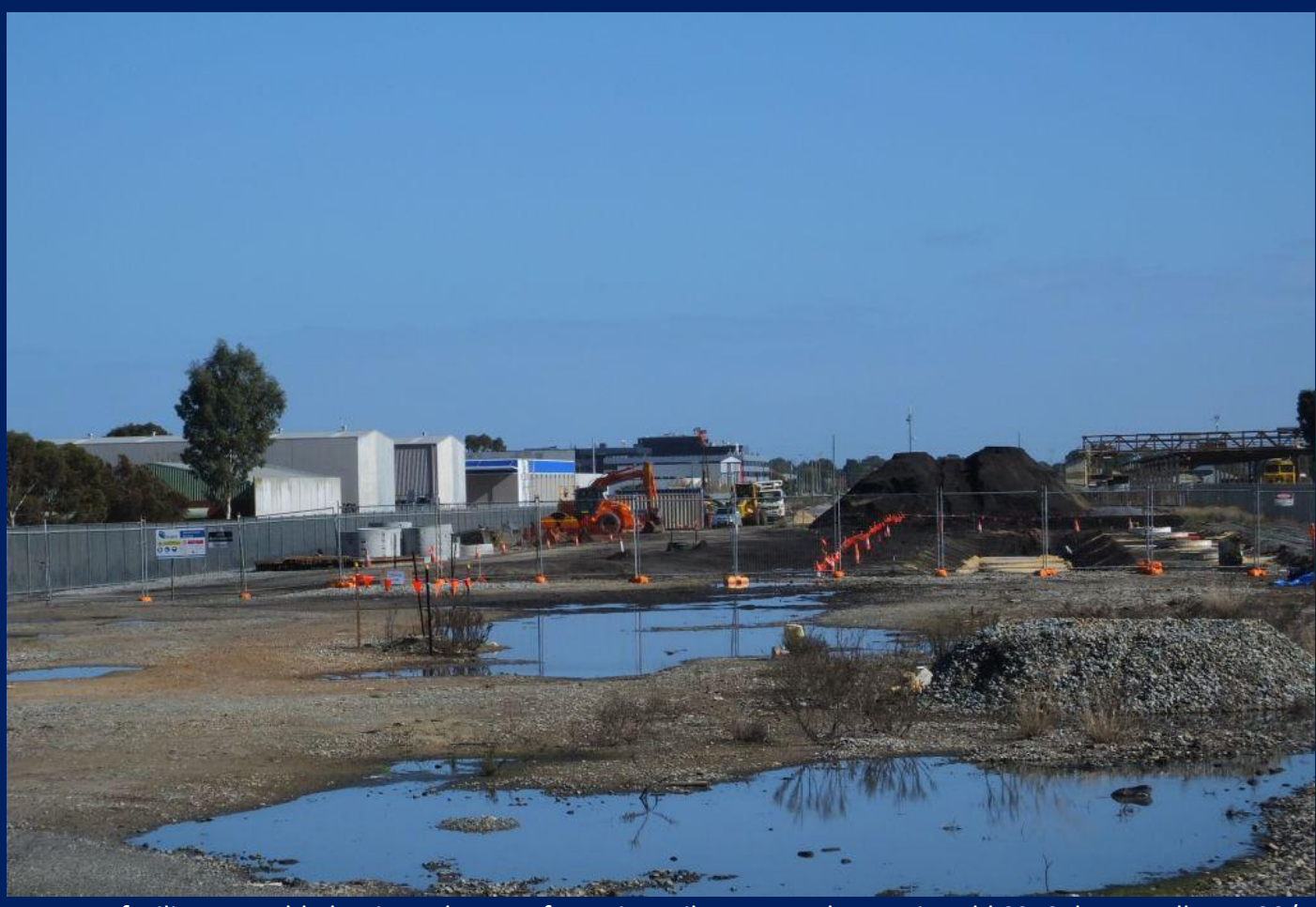
New PTA facility to enable bogie exchange of B series railcars on order on site old SSRS depot Bellevue 30/7