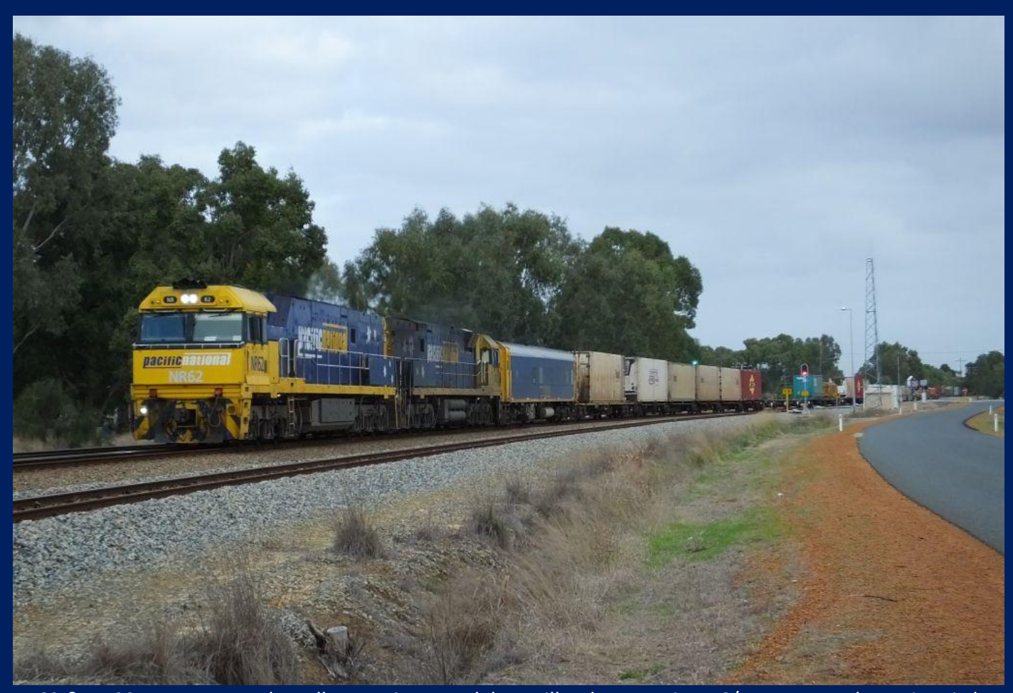
NR62 & NR23 on 1PM5 Perth Melbourne intermodal at Millendon Junction 16/7.