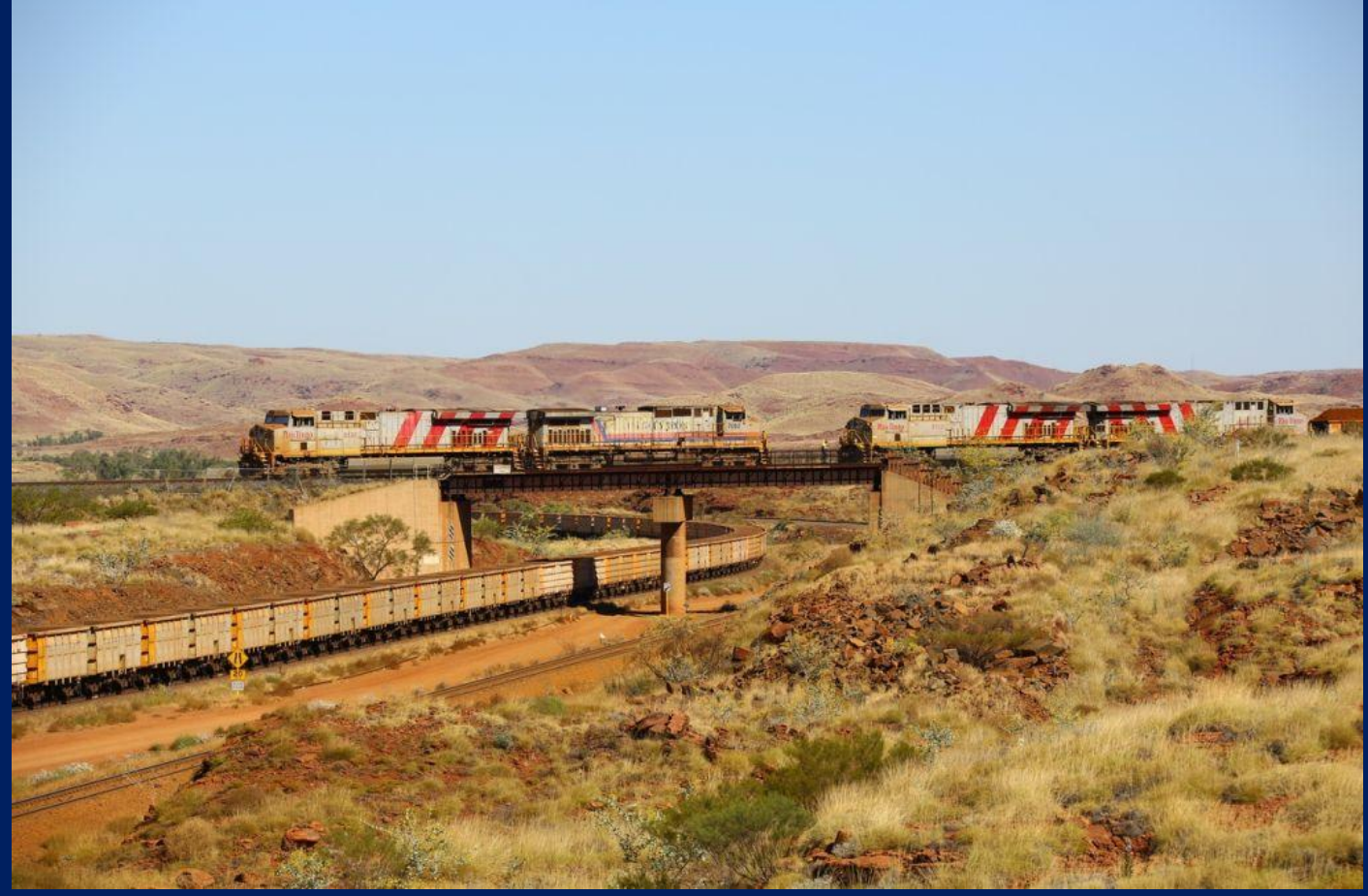
Rescue locomotives 7082 & 8137 reach failed train while empty ore passes 28/7.