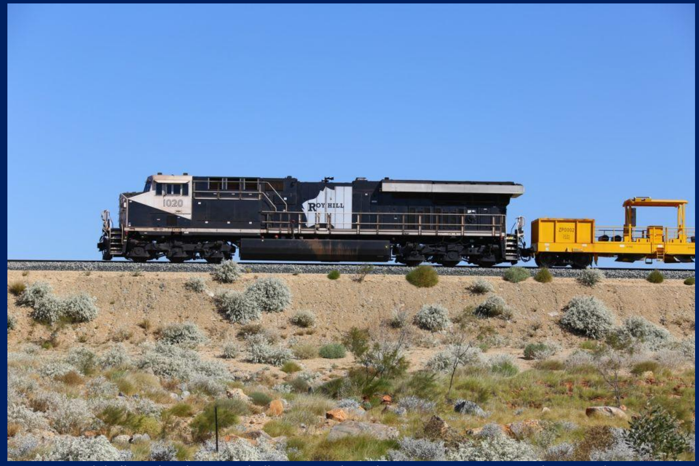
RHA 1020 with ballast plough on rear ballast train July 27th.