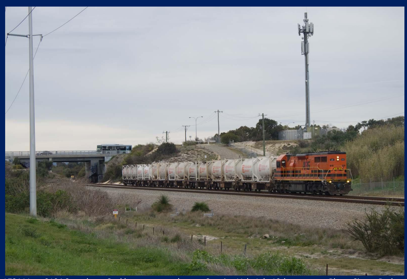
LZ3111 on 2194 Soundcem Cockburn cement shunter Canning Vale July 10th.