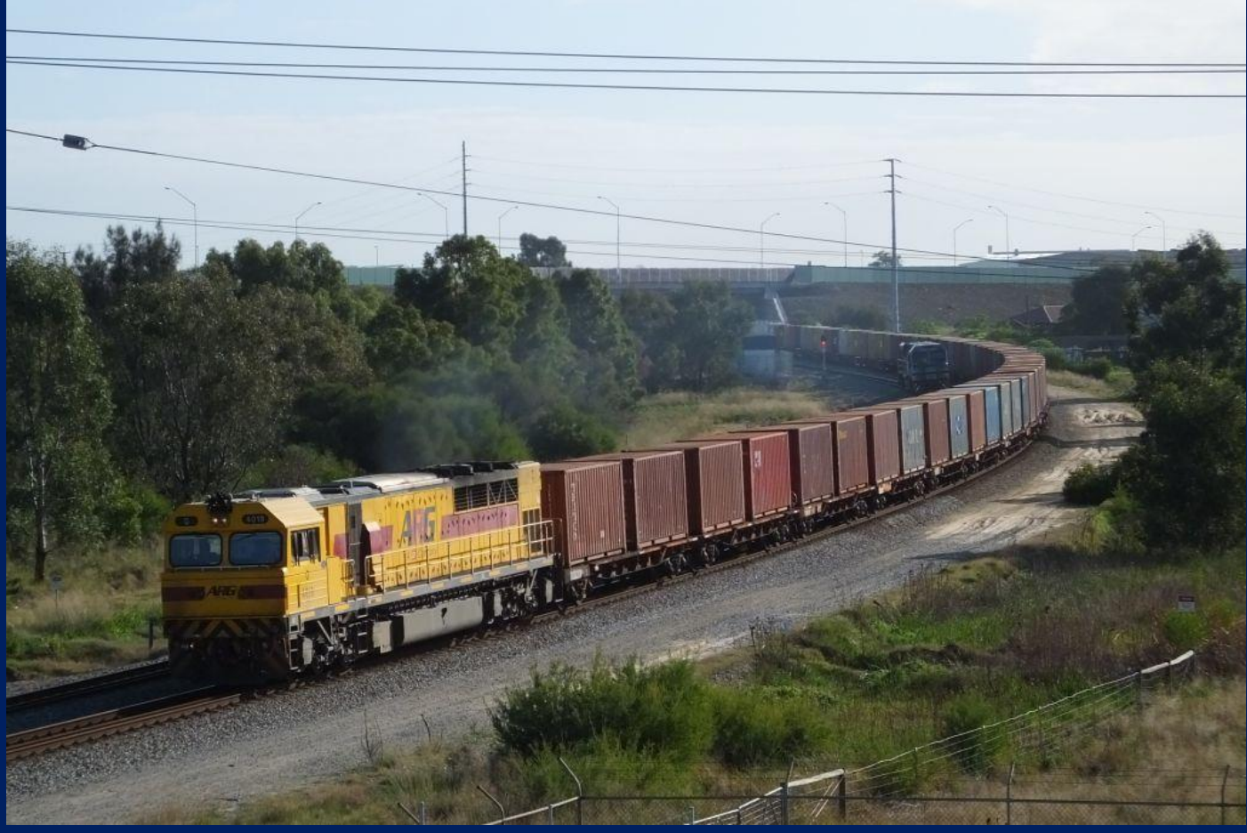
Q4019 on rare earths container train to North Port at Wattle Grove July 17th.