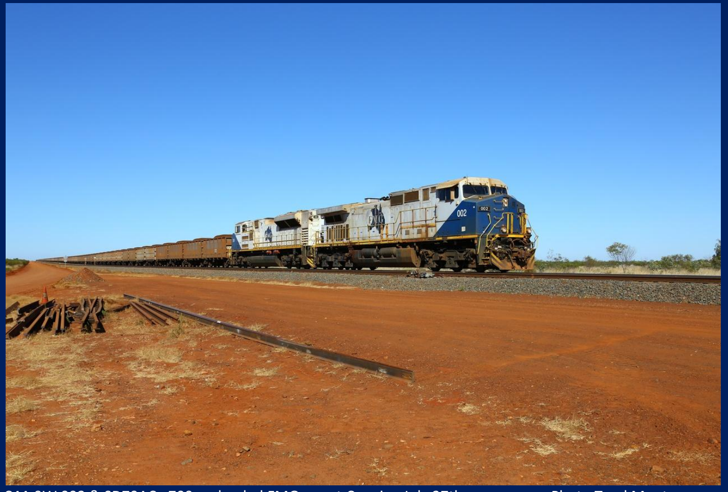
C44-9W 002 & SD70ACe 709 on loaded FMG ore at Canning July 27th.