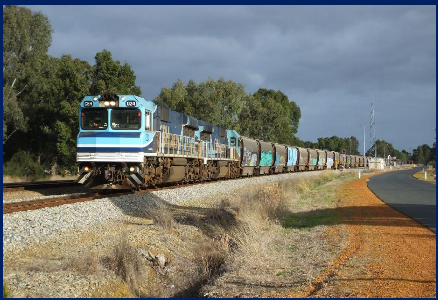
CBH024 & CBH010 on 1K53 empty Watco grain crossing onto Midland Railway at Millendon Junction 16/7.