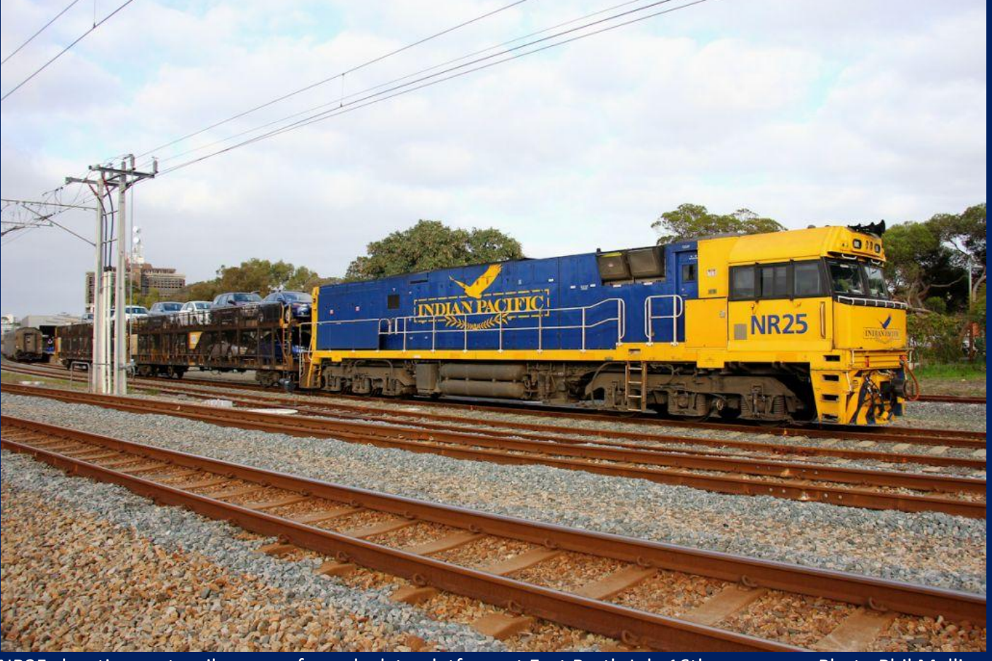
NR25 shunting motorail wagons from dock to platform at East Perth July 16th.