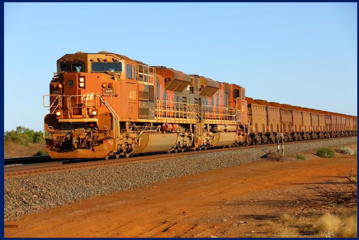
4400 & 4348 on BHPIO loaded ore at 54.9km grade crossing July 30th.