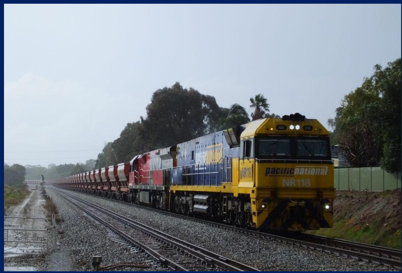
NR118 & MRL001 on 6030 Polaris ore in the rain at Hazelmere July 28th.