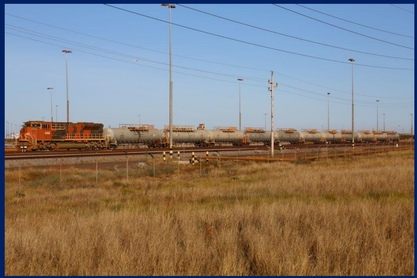
4468 shunting fuel train in Nelson Point Yards Port Hedland July 27th.