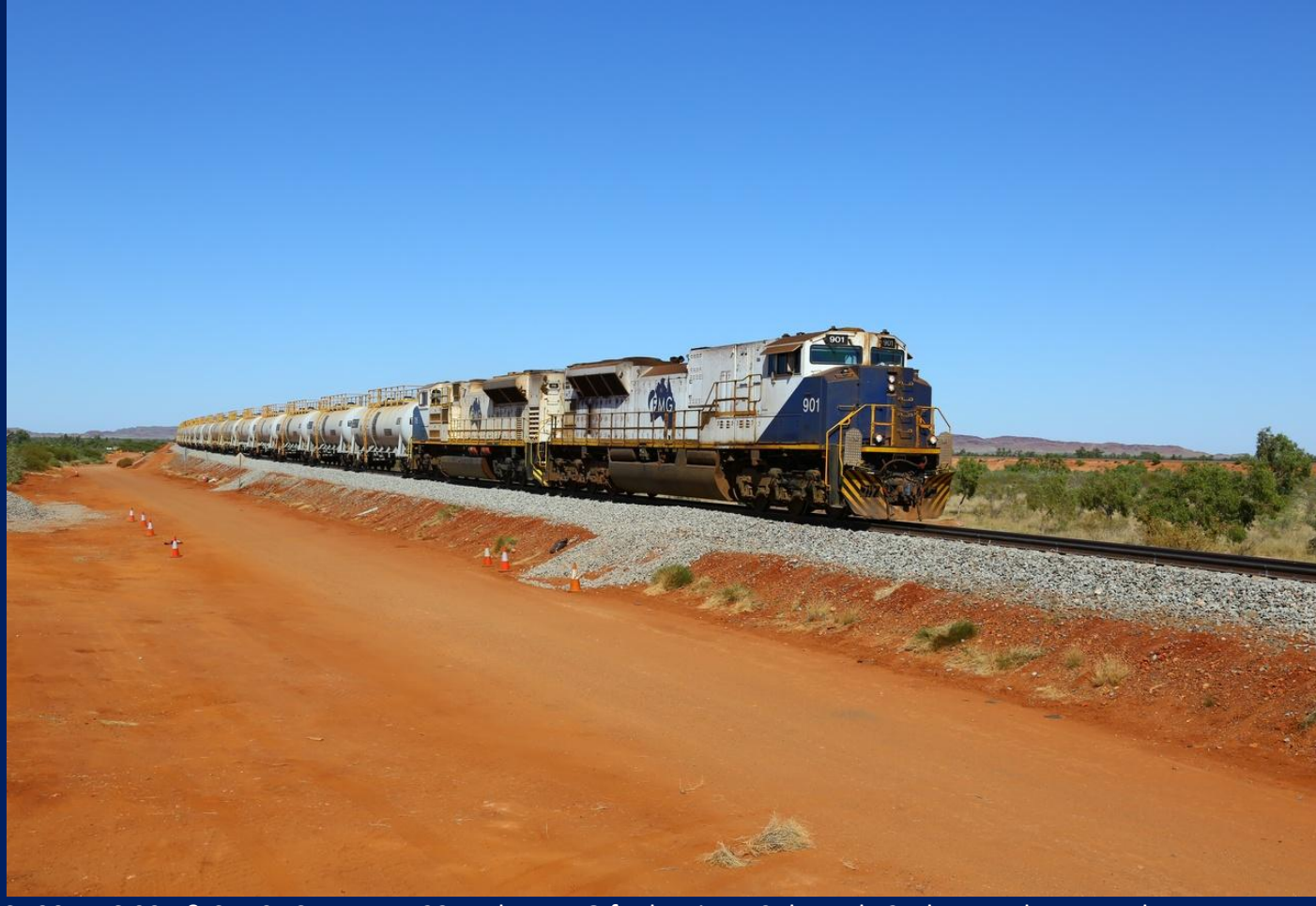
SD90MAC 901 & SD70ACe 715 on 23 tanker FMG fuel train at 91km July 27th.