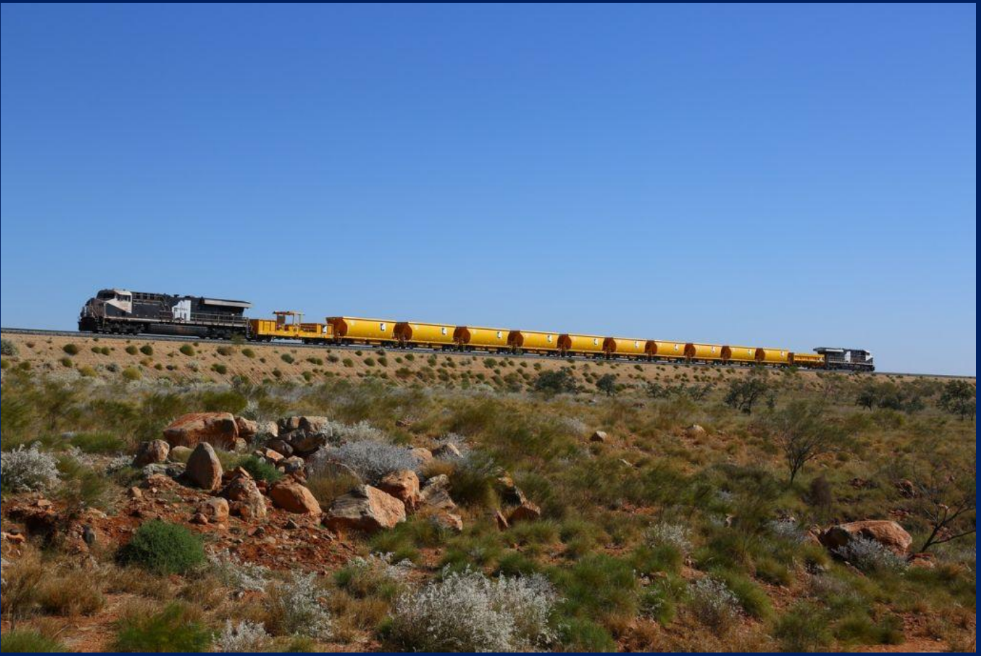
RHA 1020 trailing RHA 1006 on ballast train on Roy Hill line July 27th.