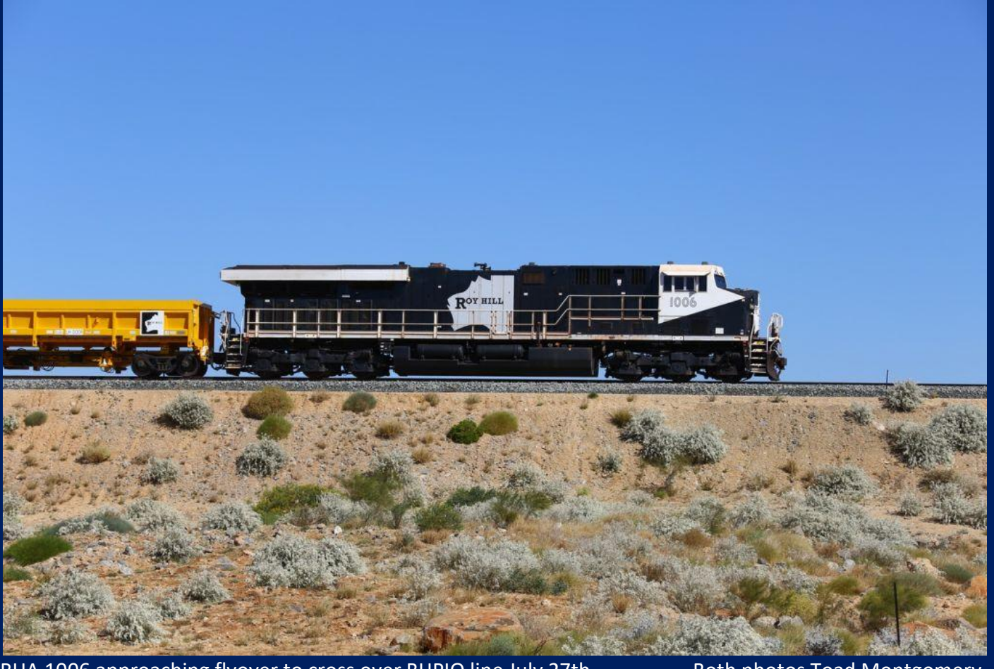
RHA 1006 approaching flyover to cross over BHPIO line July 27th.