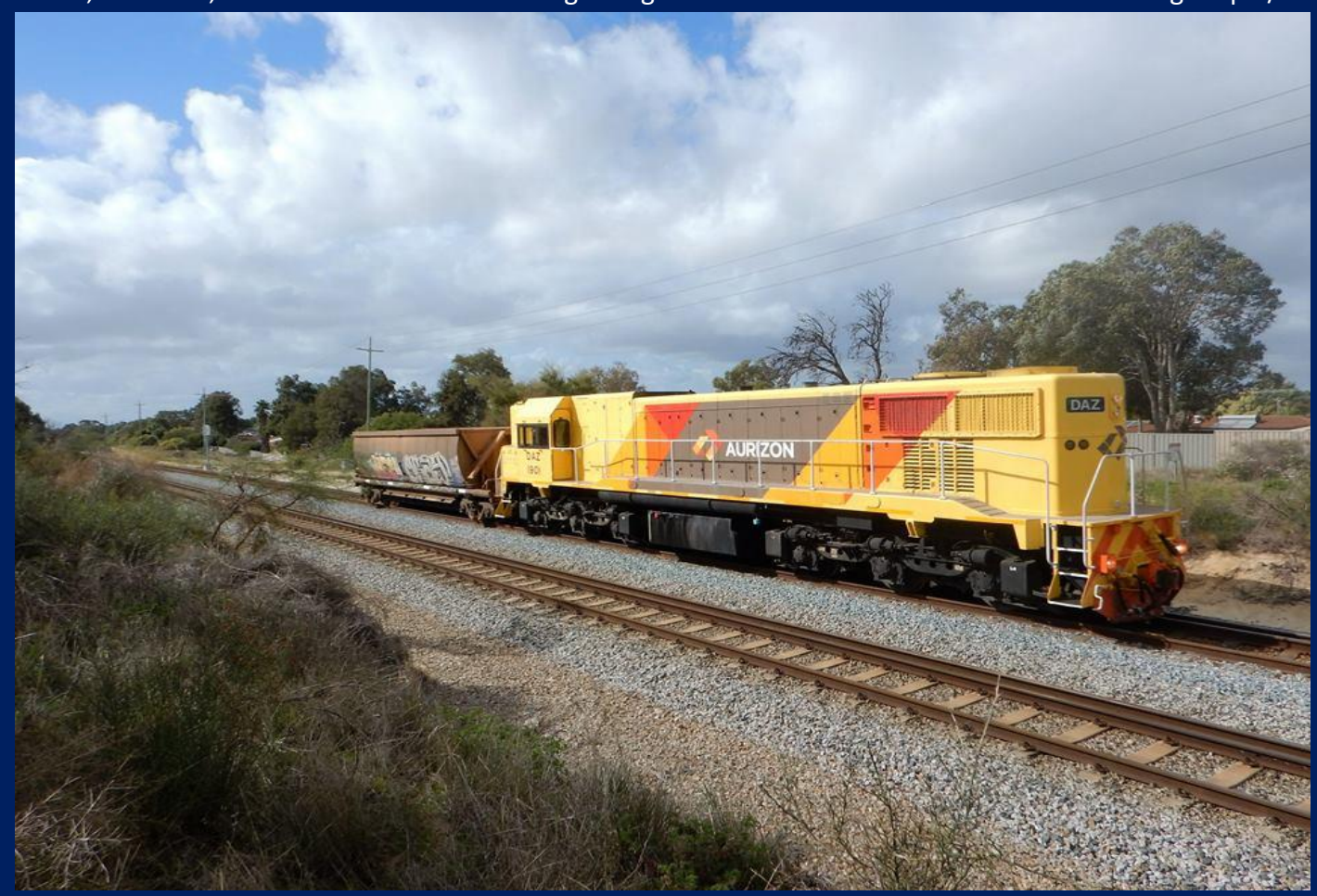
DAZ1901 on 6120 with XC wagon to Kwinana Yangebup July 21st.