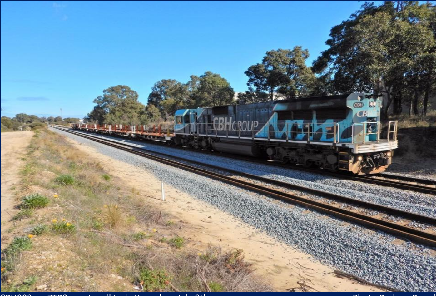
CBH002 on 7TR3 empty rail train Yangebup July 8th.