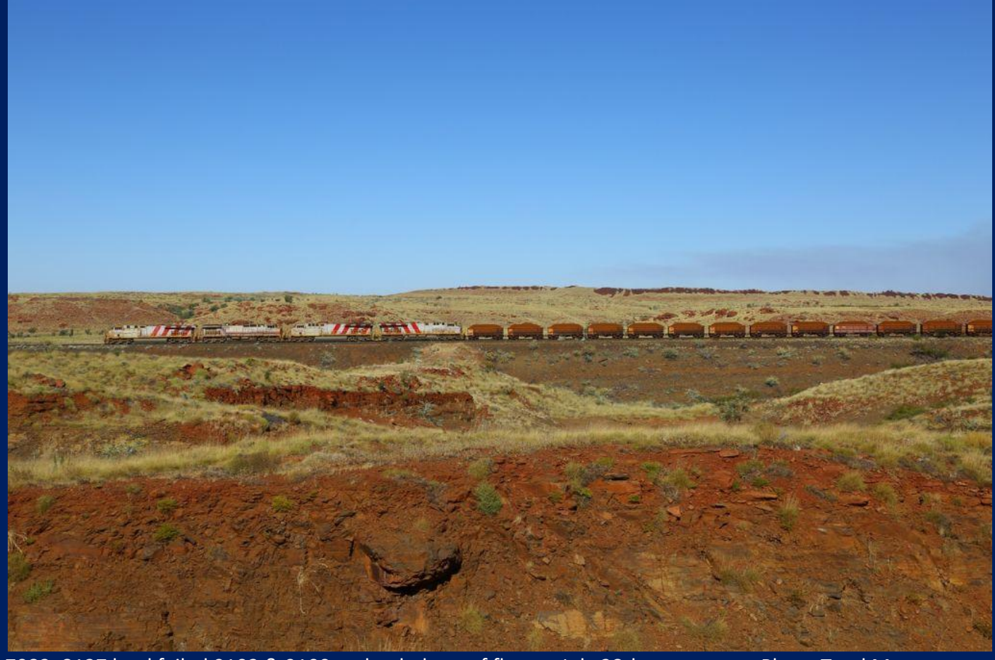
7082, 8137 haul failed 9103 & 9100 on loaded ore of flyover July 28th.