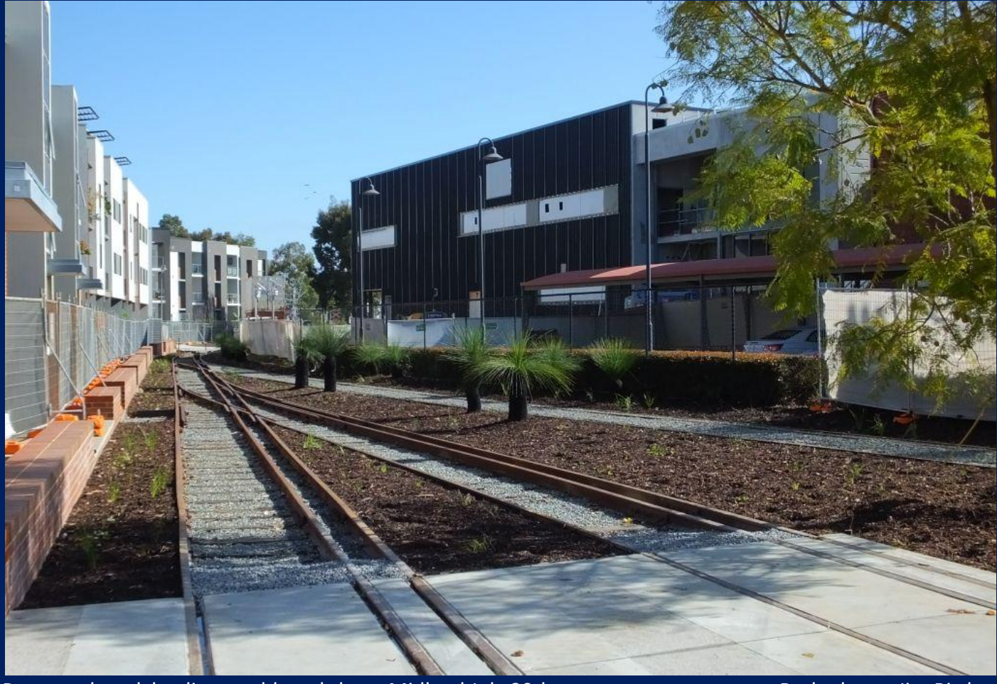
Preserved track leading to old workshops Midland July 30th.