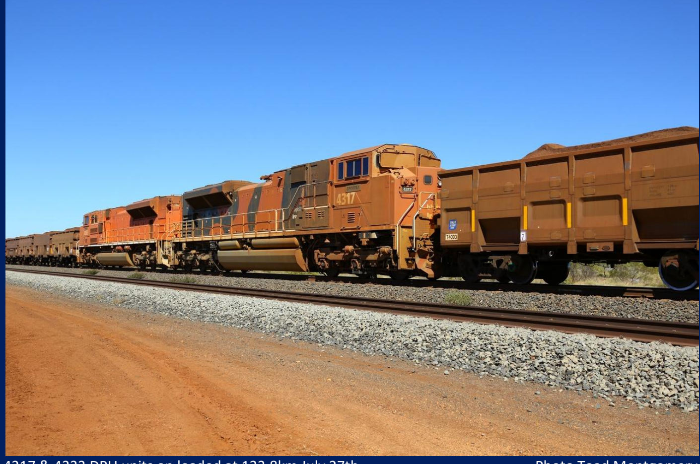
4317 & 4333 DPU units on loaded at 123.8km July 27th.