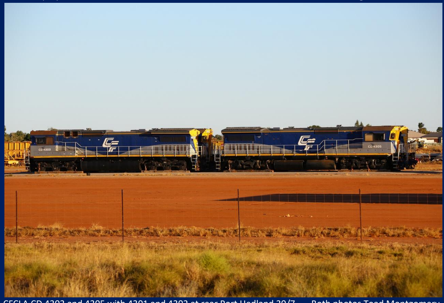
CFCLA CD 4303 and 4305 with 4301 and 4302 at rear Port Hedland 30/7.