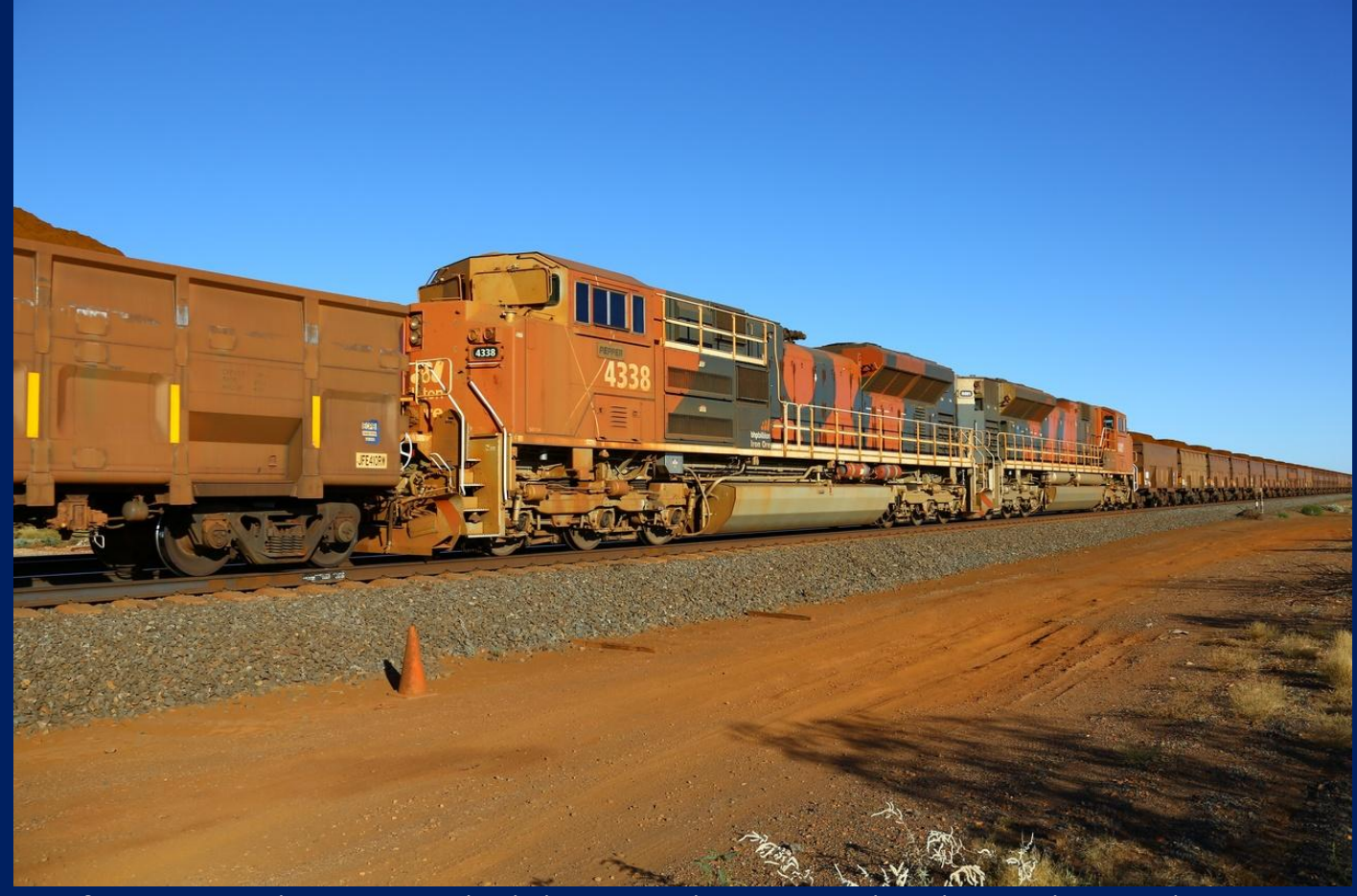
4338 & 4481 DPU mid train units on loaded ore at 54.9km crossing July 30th.