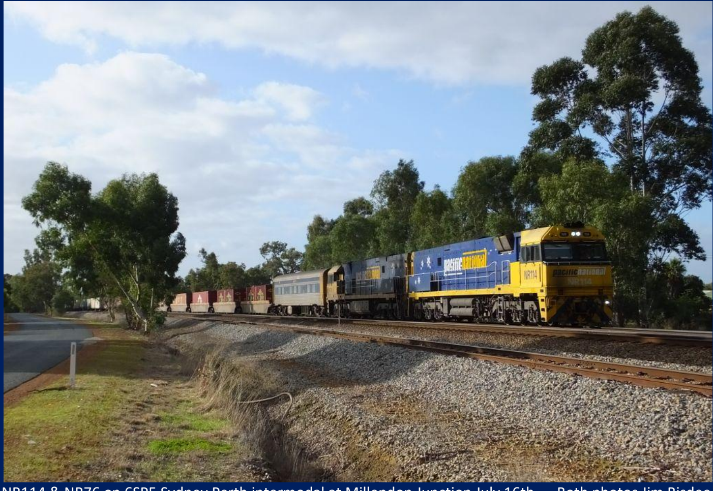
NR114 & NR76 on 6SP5 Sydney Perth intermodal at Millendon Junction July 16th.