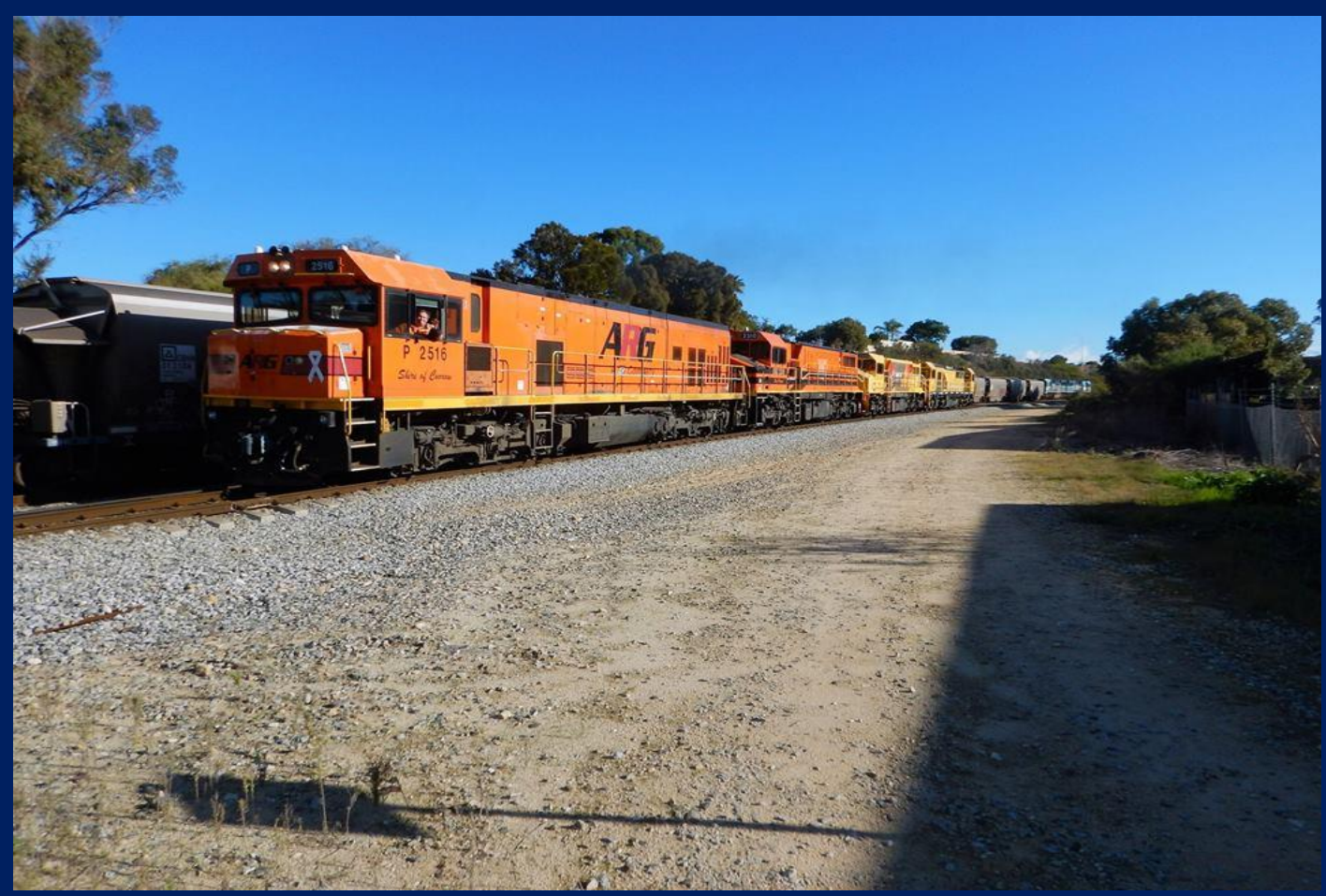
P2516, DBZ2310, DBZ2309 & S3305 on 6121 light engine movement Kwinana to Forrestfield Yangebup 7/7.