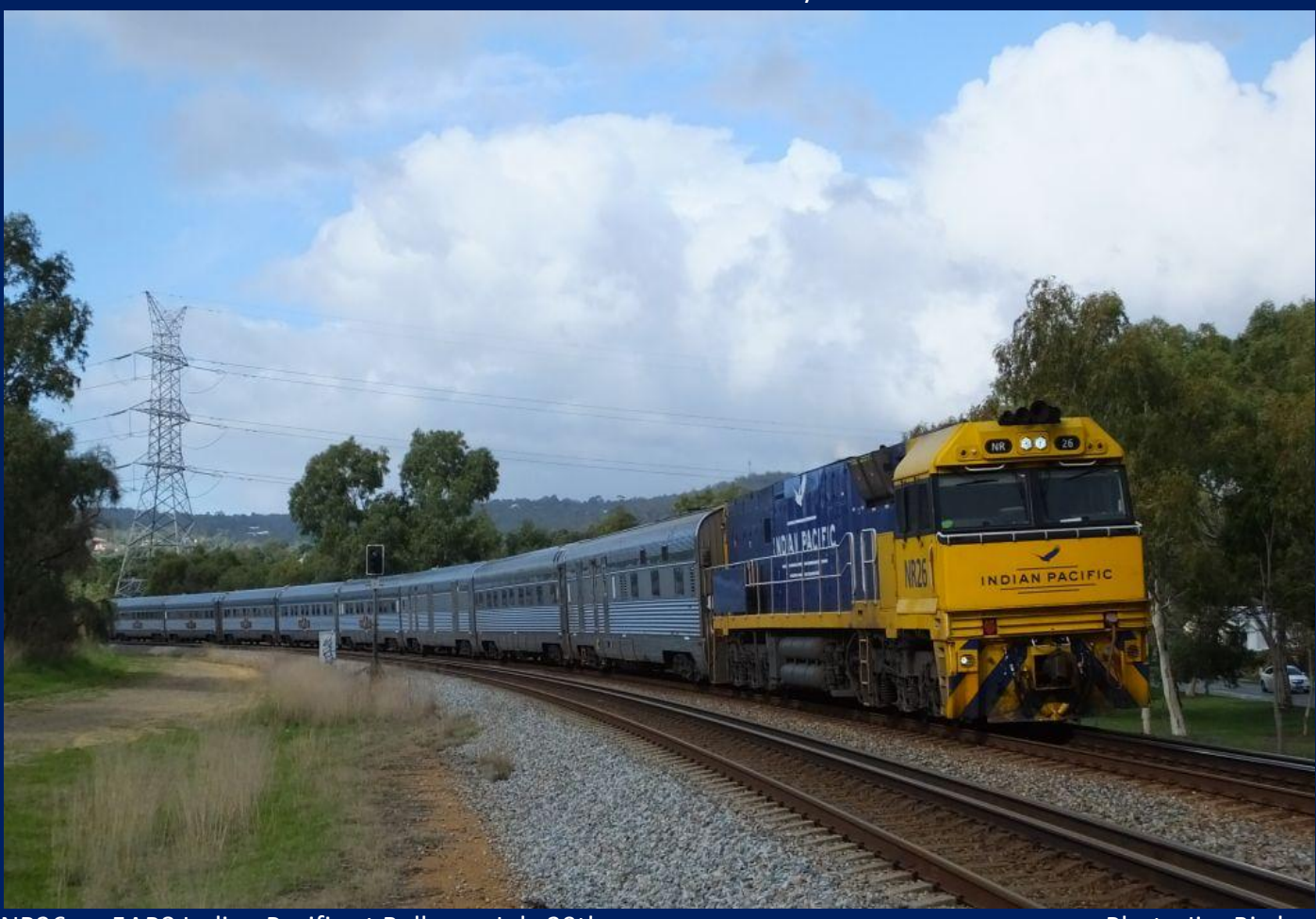
NR26 on 5AP8 Indian Pacific at Bellevue July 29th.