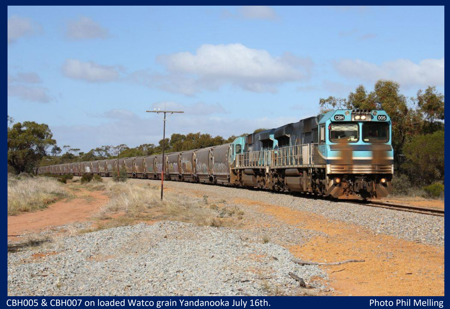
CBH005 & CBH007 on loaded Watco grain Yandanooka July 16th.