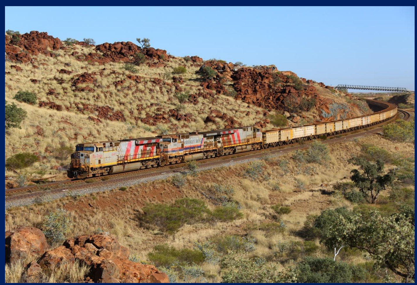
8147, 7065 & 8149 on empty ore from Cape Lambert to mines 37km 28/7.