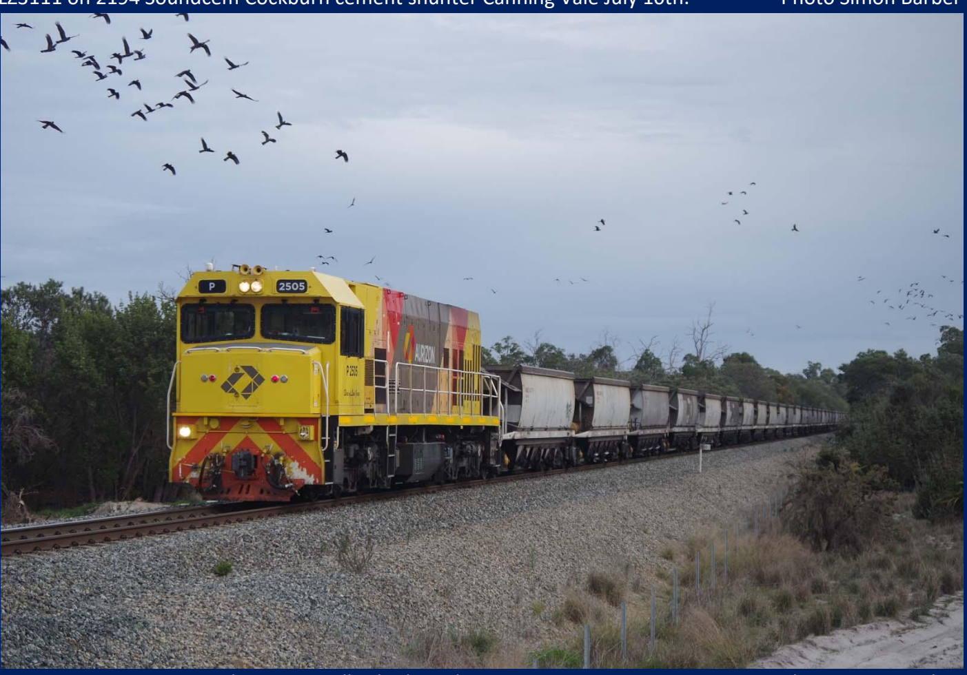
P2505 on 2253 empty coal train at Wellard July 10th.