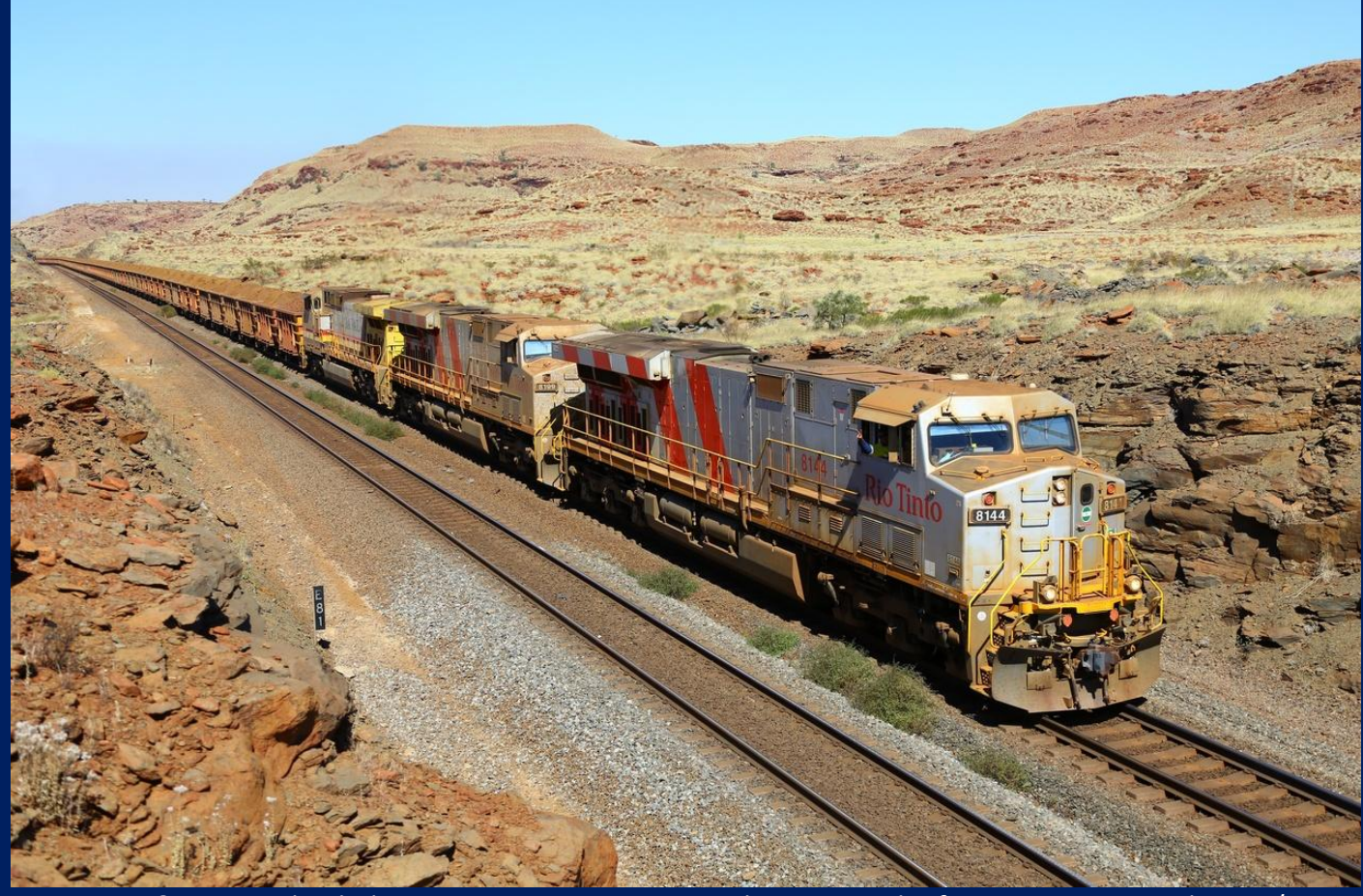
8144, 8199 & 9403 on loaded ore on way to Dampier at 81km just south of Emu on Tom Price line 28/7.