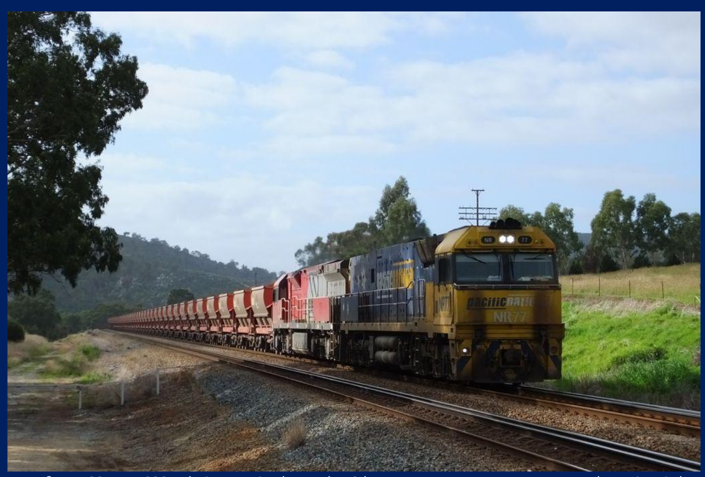
NR77 & MRL005 on 1030 Polaris ore Brigadoon July 16th.