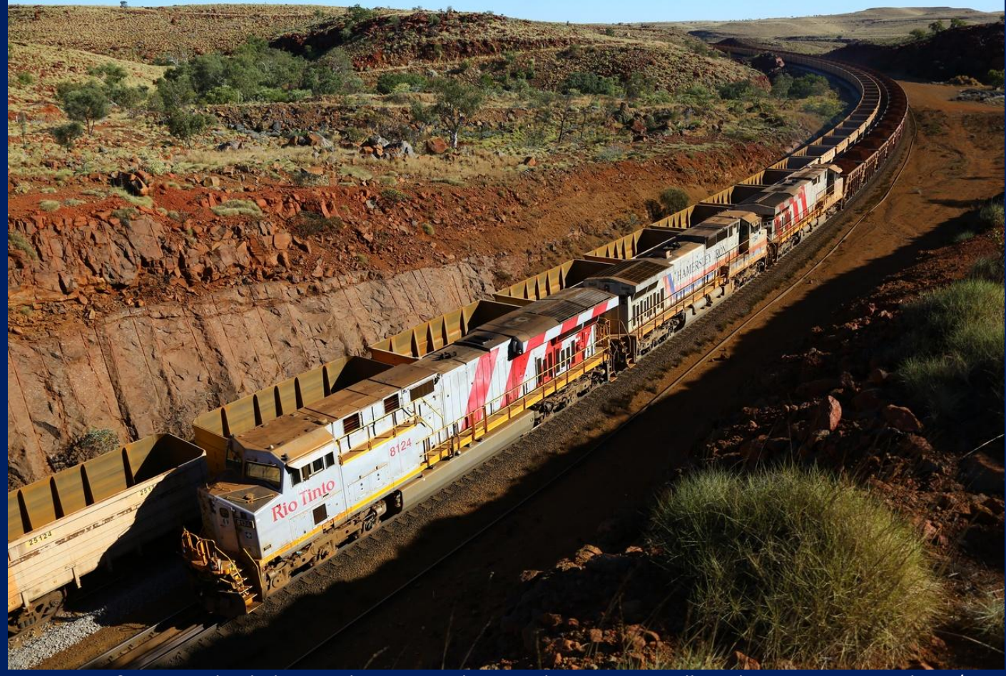
8124, 7094 & 8186 on loaded ore in dynamic on downgrade at Benson Falls with empty on upgrade 28/7.