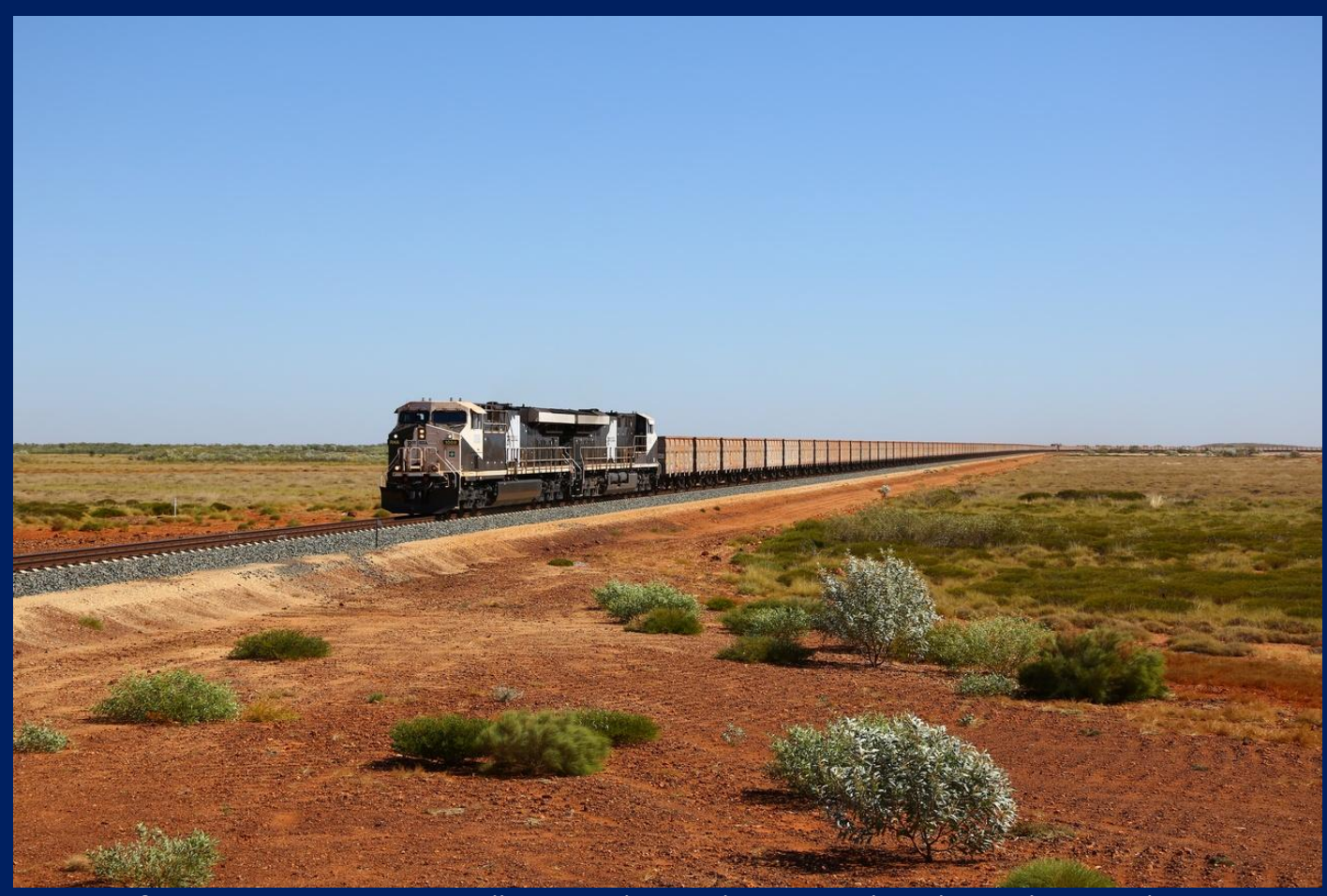
RHA 1008 & RHA 1018 on empty Roy Hill ore at Indee Road Crossing July 30th.