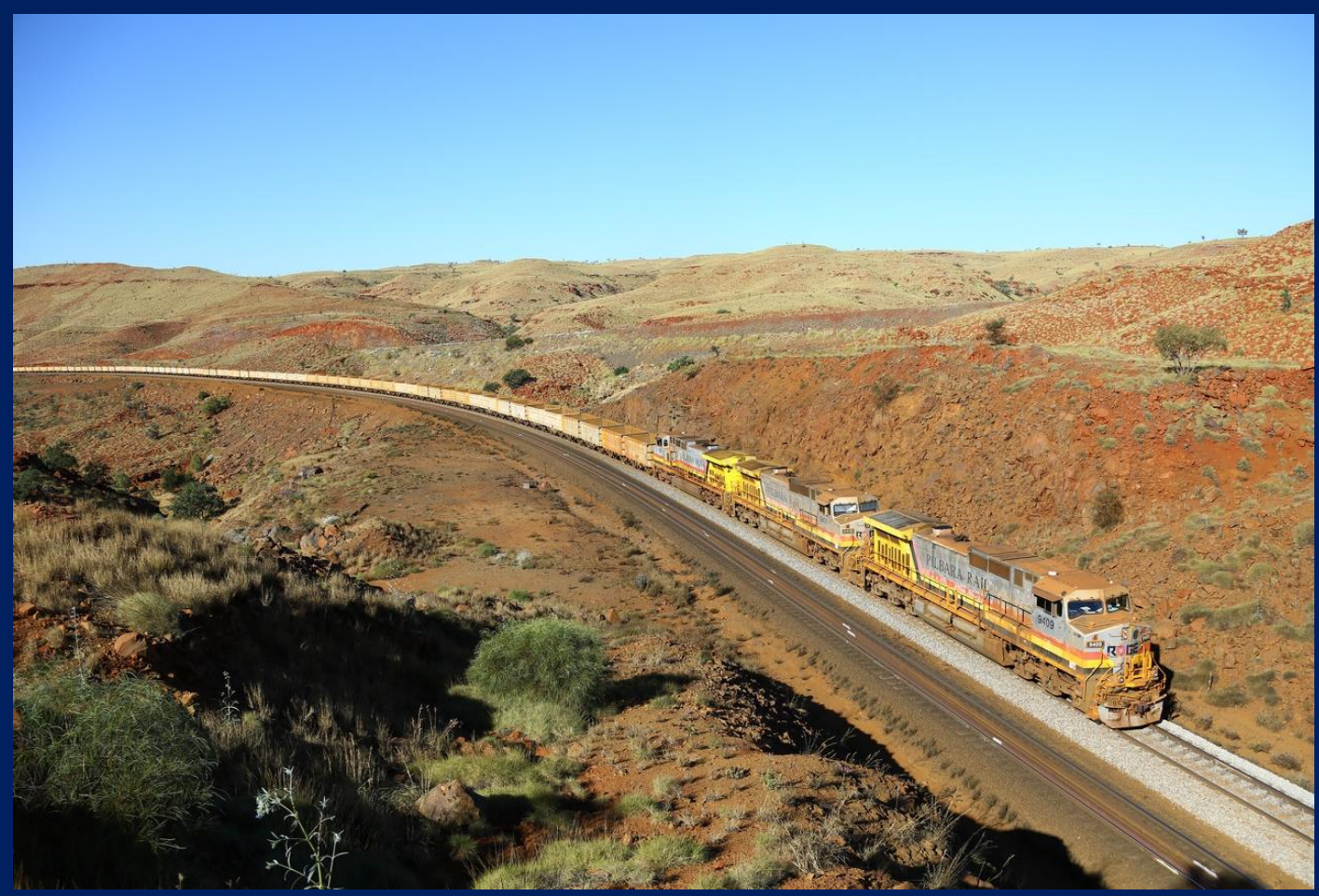
C44-9W 9409, 9408 & 7060 on empty climbing grade at 91km July 28th.