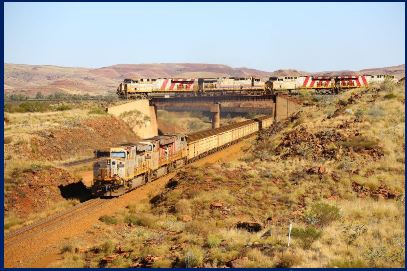
8100, 8176 & 8143 on loaded ore to Dampier runs beneath disabled train 28/7.