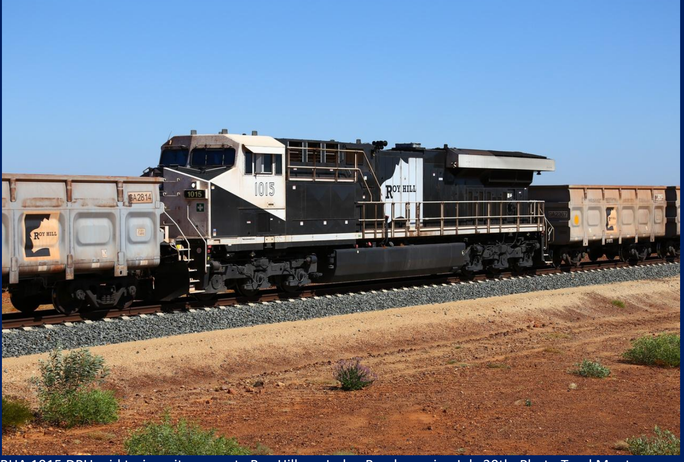
RHA 1015 DPU mid train unit on empty Roy Hill ore Indee Road crossing July 30th.