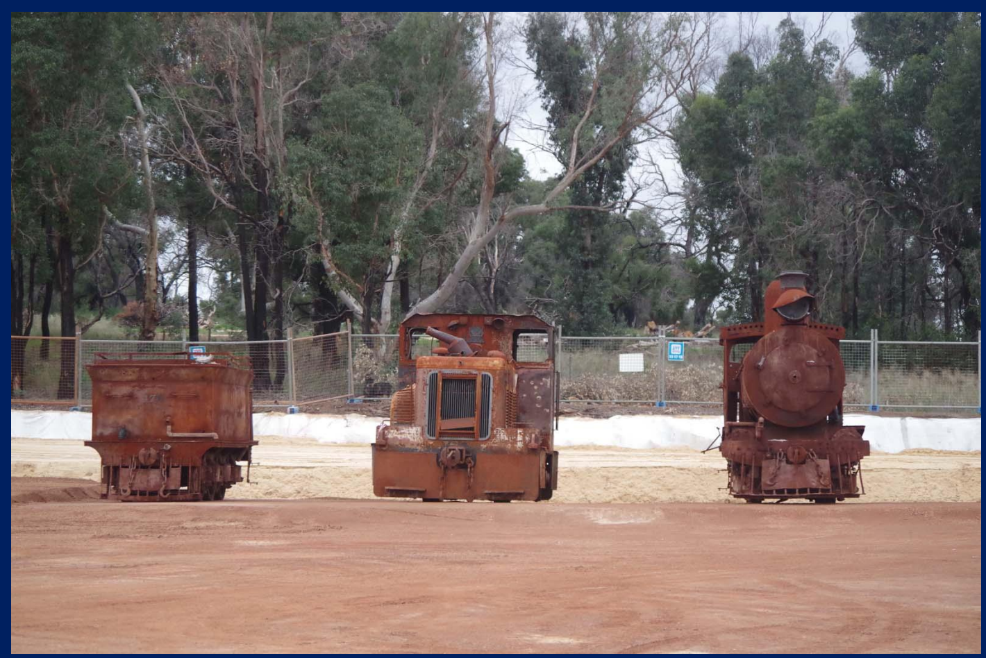
Bunnings Yx176 and Millars 0-6-0 diesel shunter badly damaged in Yarloop fire now turned round at the site of the destroyed Yarloop Workshops Museum June 25th.