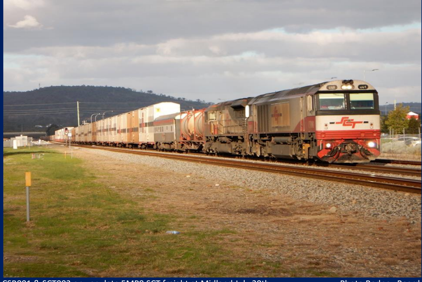
CSR001 & SCT002 on very late 5MP9 SCT freight at Midland July 30th.