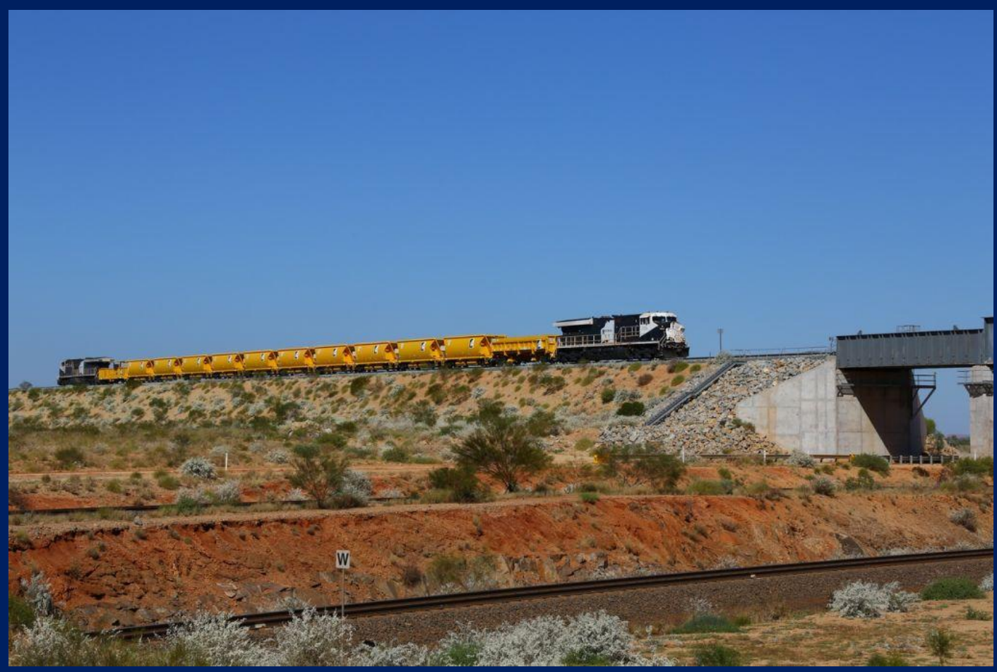
ES44ACi RHA 1006 leading RHA 1020 trailing on Roy Hill ballast train crossing BHPIO line 27/7 at 169.5km