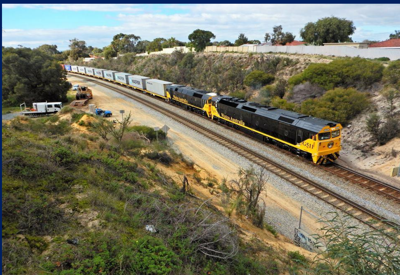
G511 & HL203 on 2142 Watco ILS port shuttle to North Port at Spearwood July 7th.