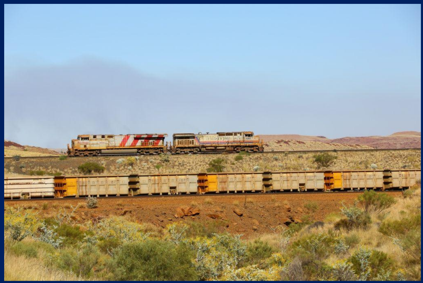
7082 & 8137 light engine rescue locomotives crawl up grade on flyover 28/7.