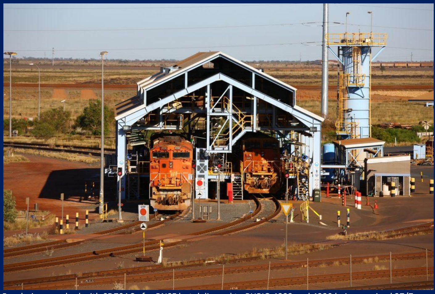
Boodarie prep shed with SD70ACe for BNSF but delivered to BHPIO 4332 and 4330 being serviced 27/7.