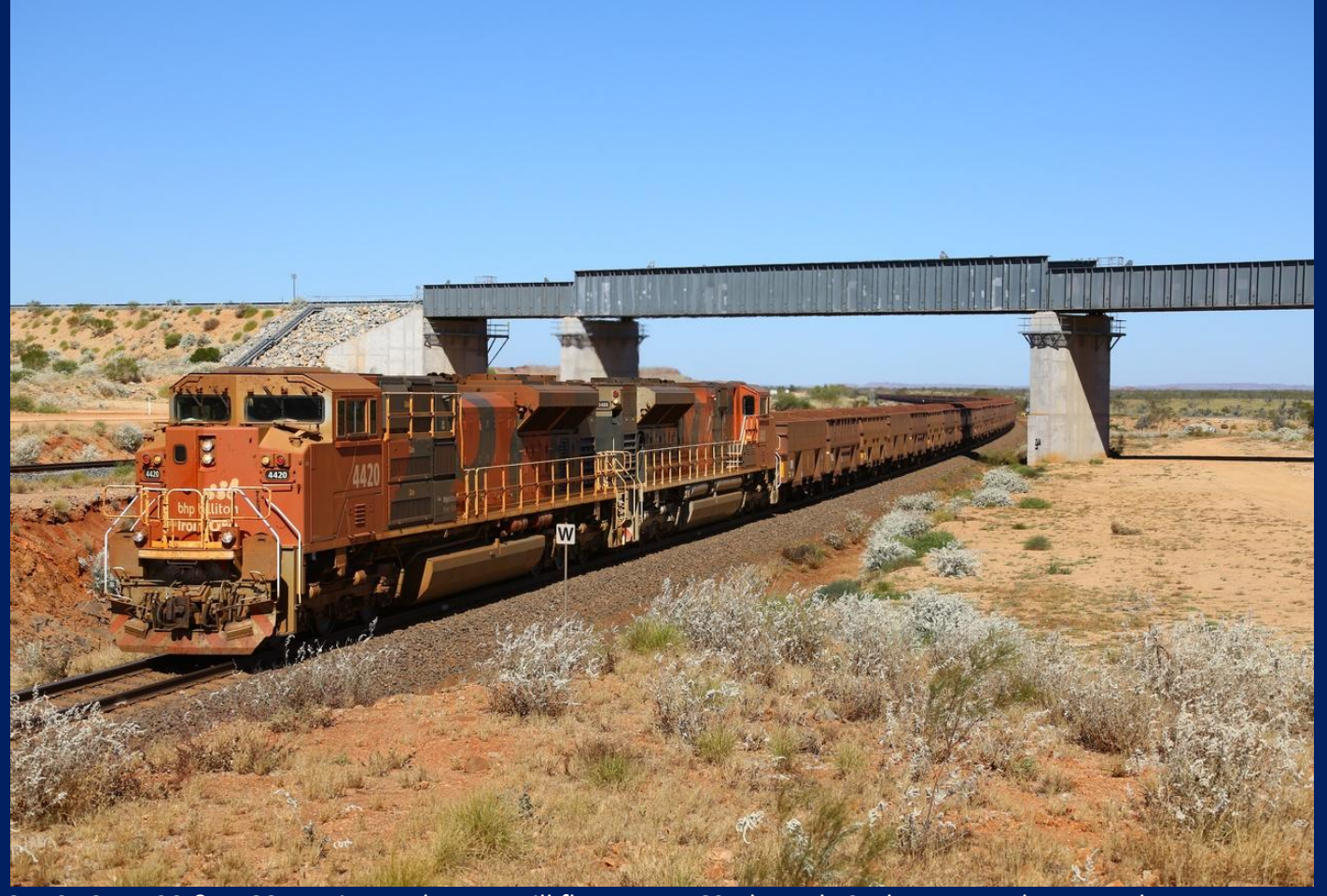
SD70ACe 4420 & 4488 passing under Roy Hill flyover at 169.5km July 27th.