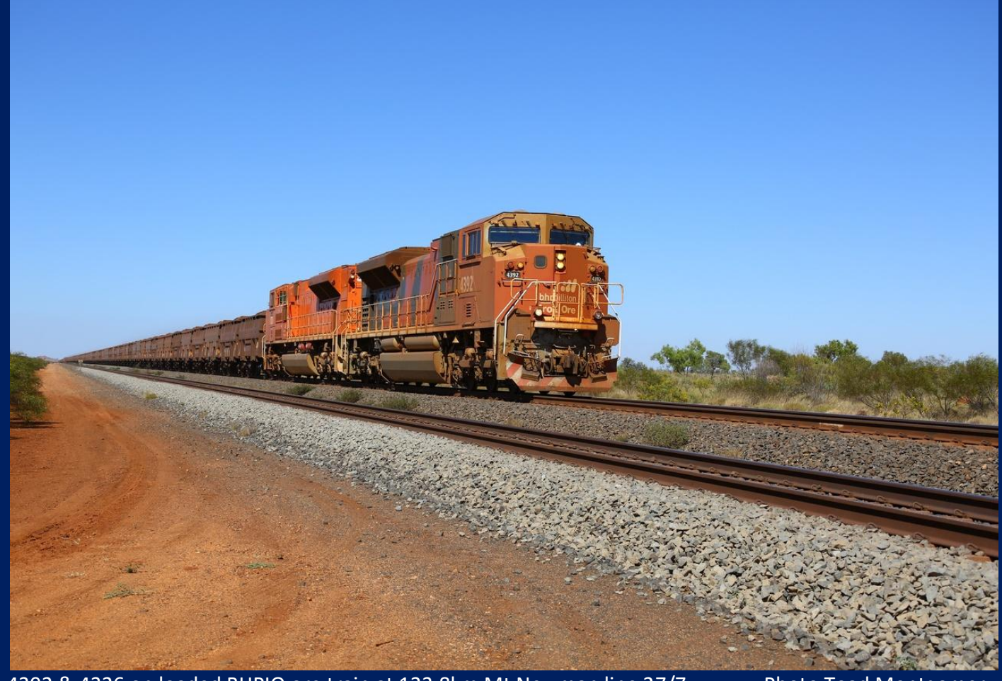
4392 & 4326 on loaded BHPIO ore train at 123.8km Mt Newman line 27/7.