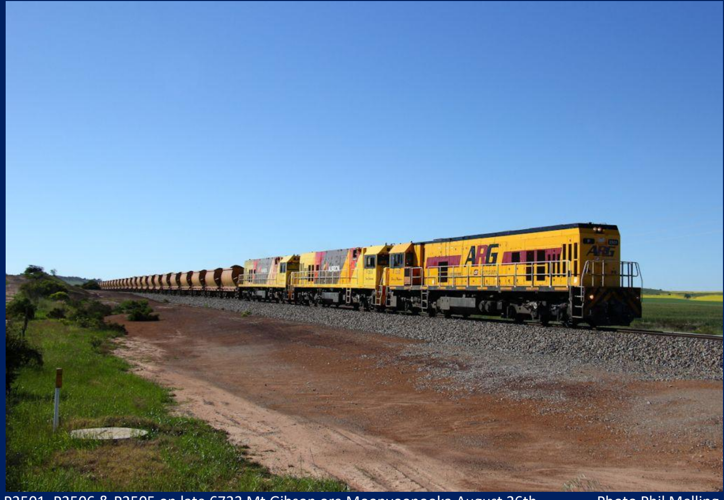
P2501, P2506 & P2505 on late 6723 Mt Gibson ore Moonyoonooka August 26th.