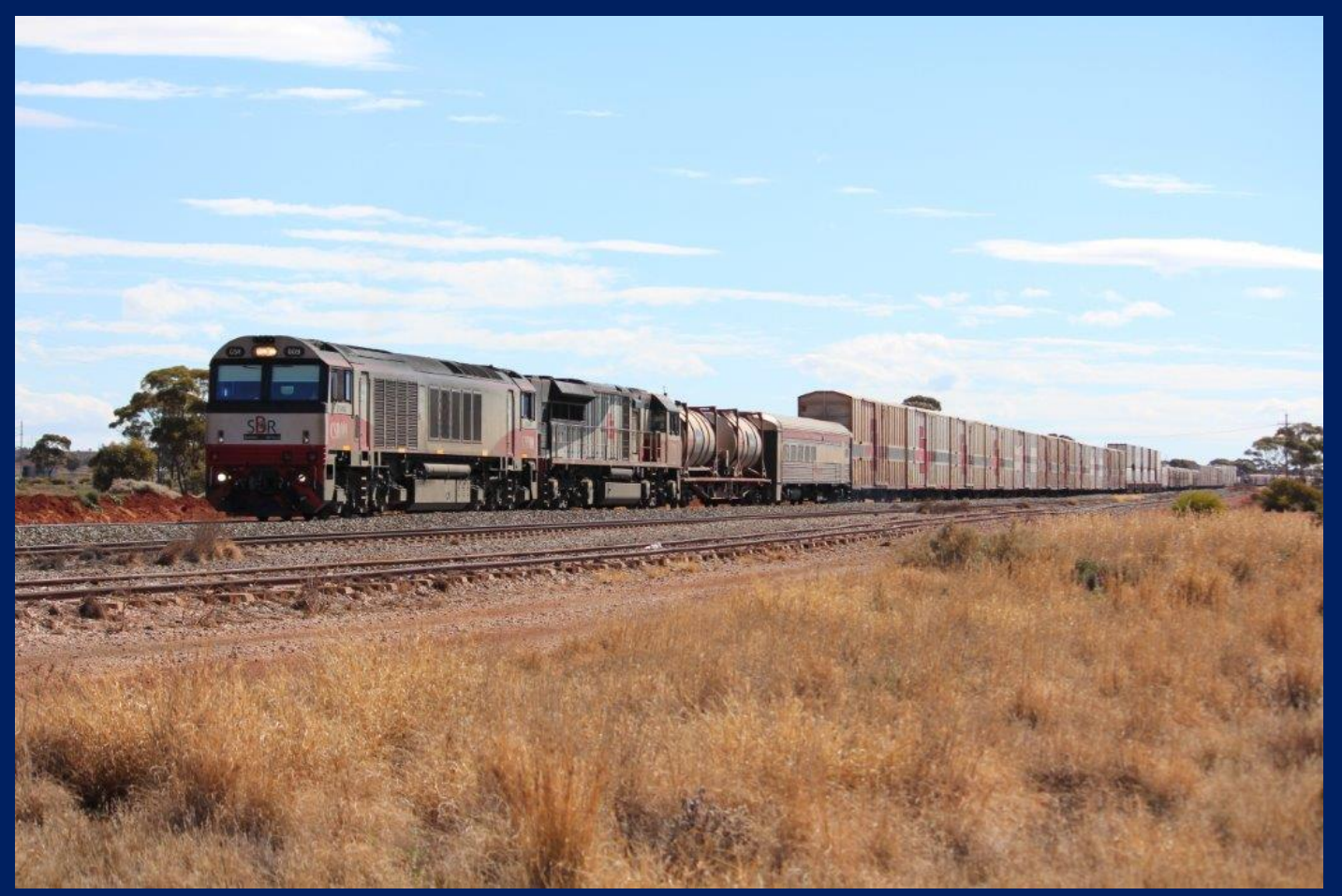
CSR009 & SCT013 on late 6PM9 SCT freight at Parkeston August 19th.