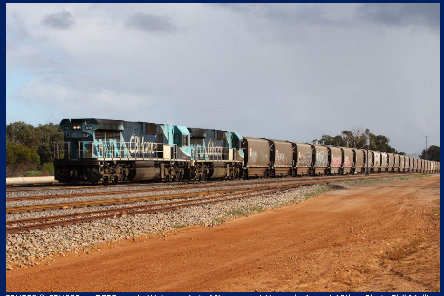
CBH008 & CBH005 on 7G50 empty Watco grain to Mingenew at Narngulu August 19th.