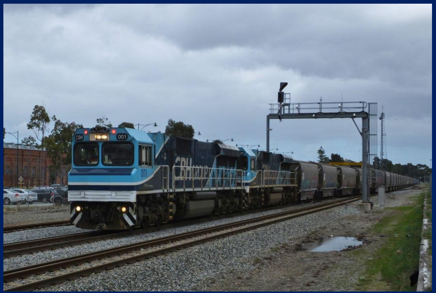
CBH001 & CBH024 on 5K11 empty Watco grain crossing down to up main Midland 17/8.