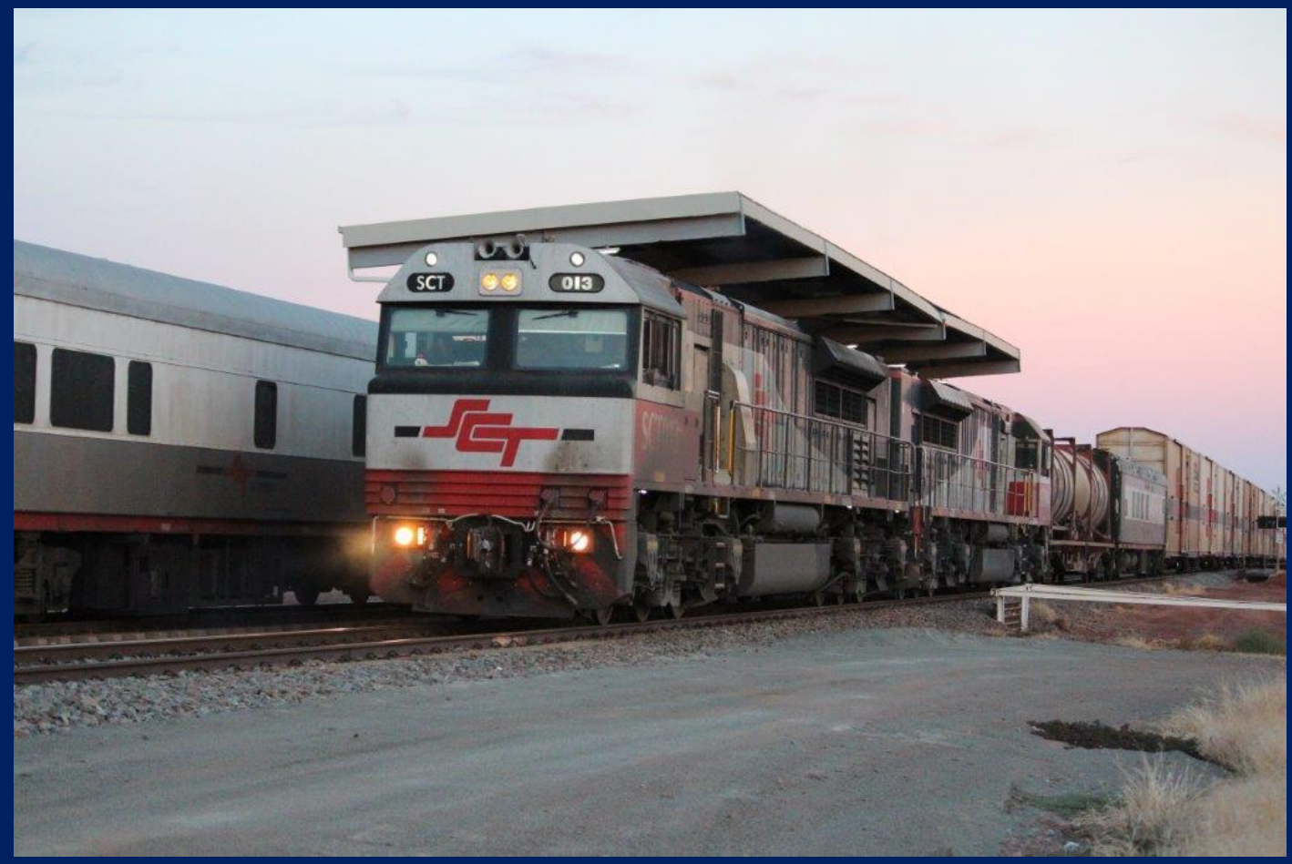
SCT013 & SCT004 on 2MP9 crosses late 3PG1 Parkeston August 23rd.