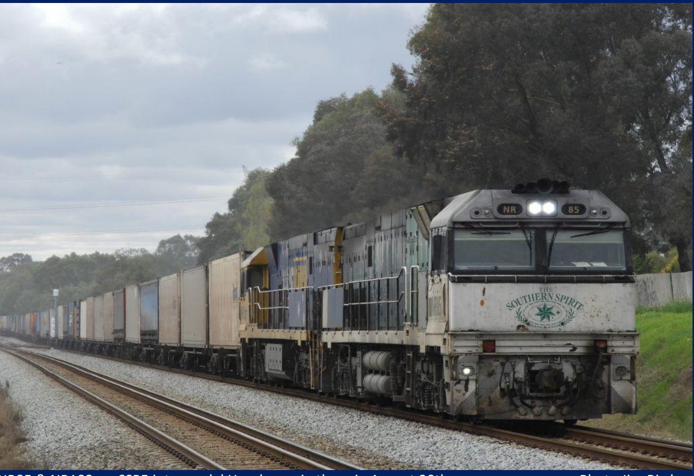
NR85 & NR103 on 6SP5 intermodal Hazelmere in the rain August 20th.