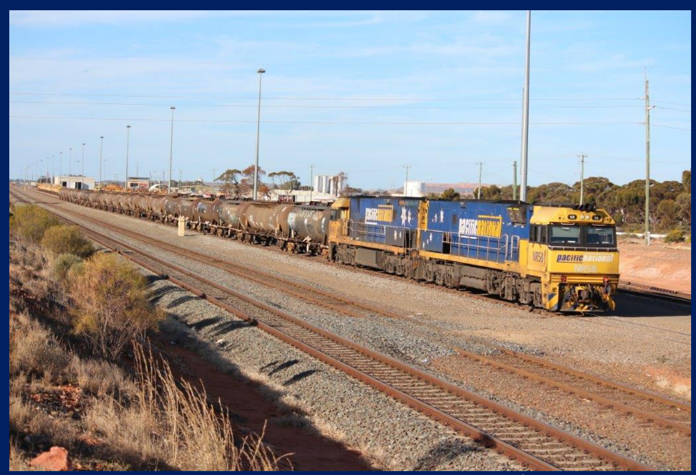
NR58 & NR45 on 4445 empty Esperance fuel train stabled awaiting departure 23/8.