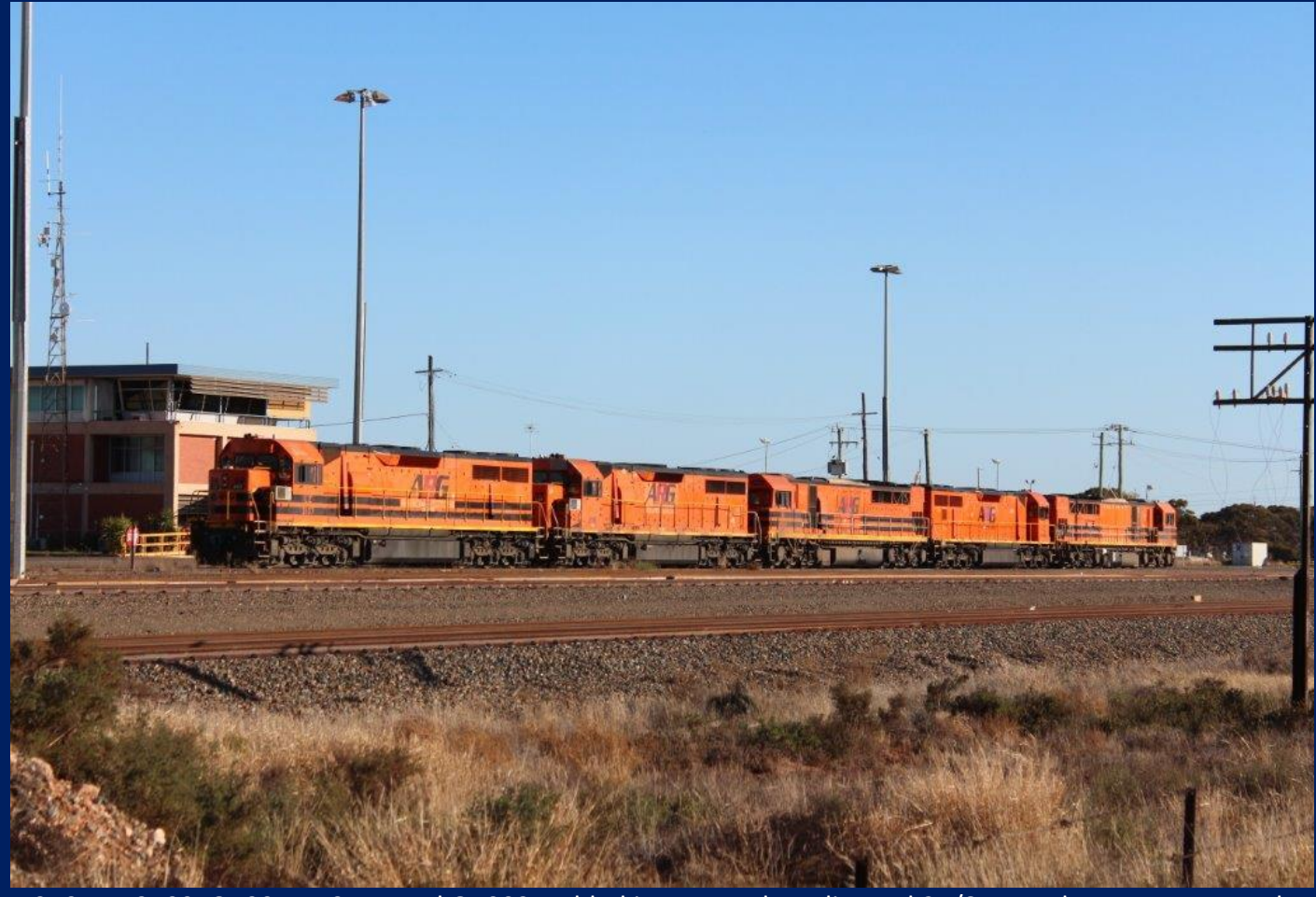
LZ3107, LZ3109, Q4004, LZ3114 and Q4003 stabled in West Kalgoorlie yard 21/8.