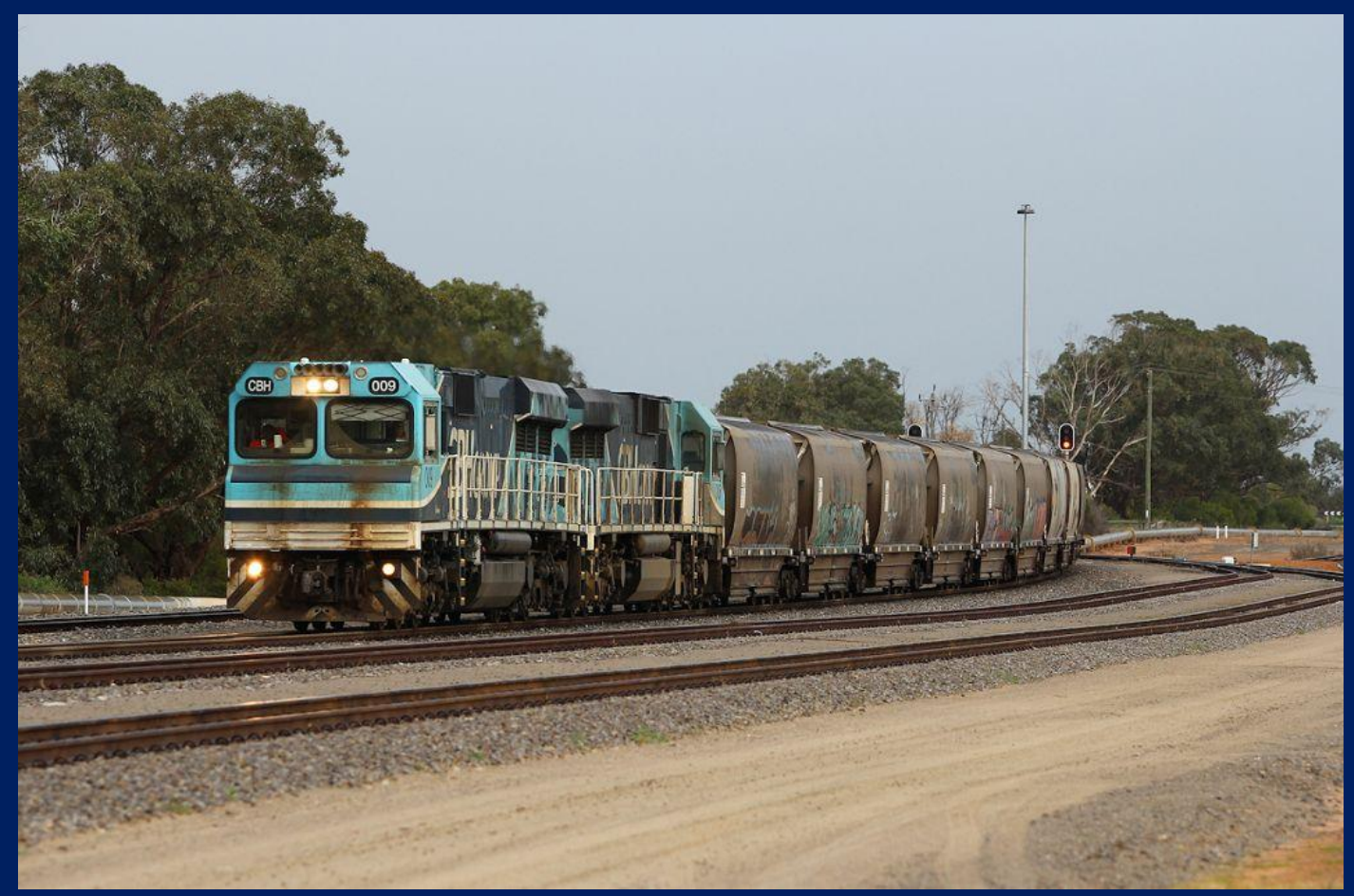
CBH009 & CBH005 on empty Watco grain to Mingenew at Narngulu August 12th.