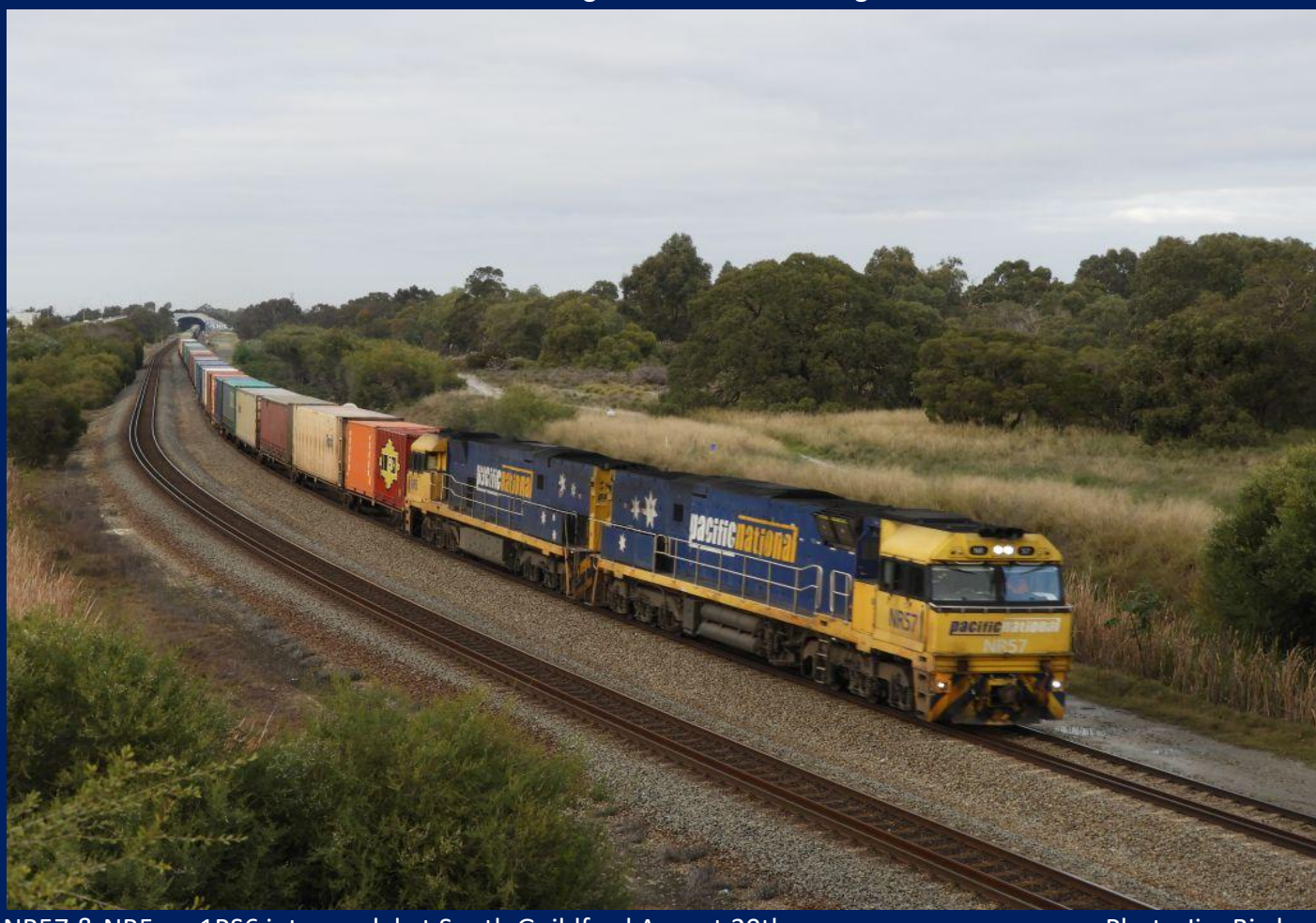
NR57 & NR5 on 1PS6 intermodal at South Guildford August 20th.