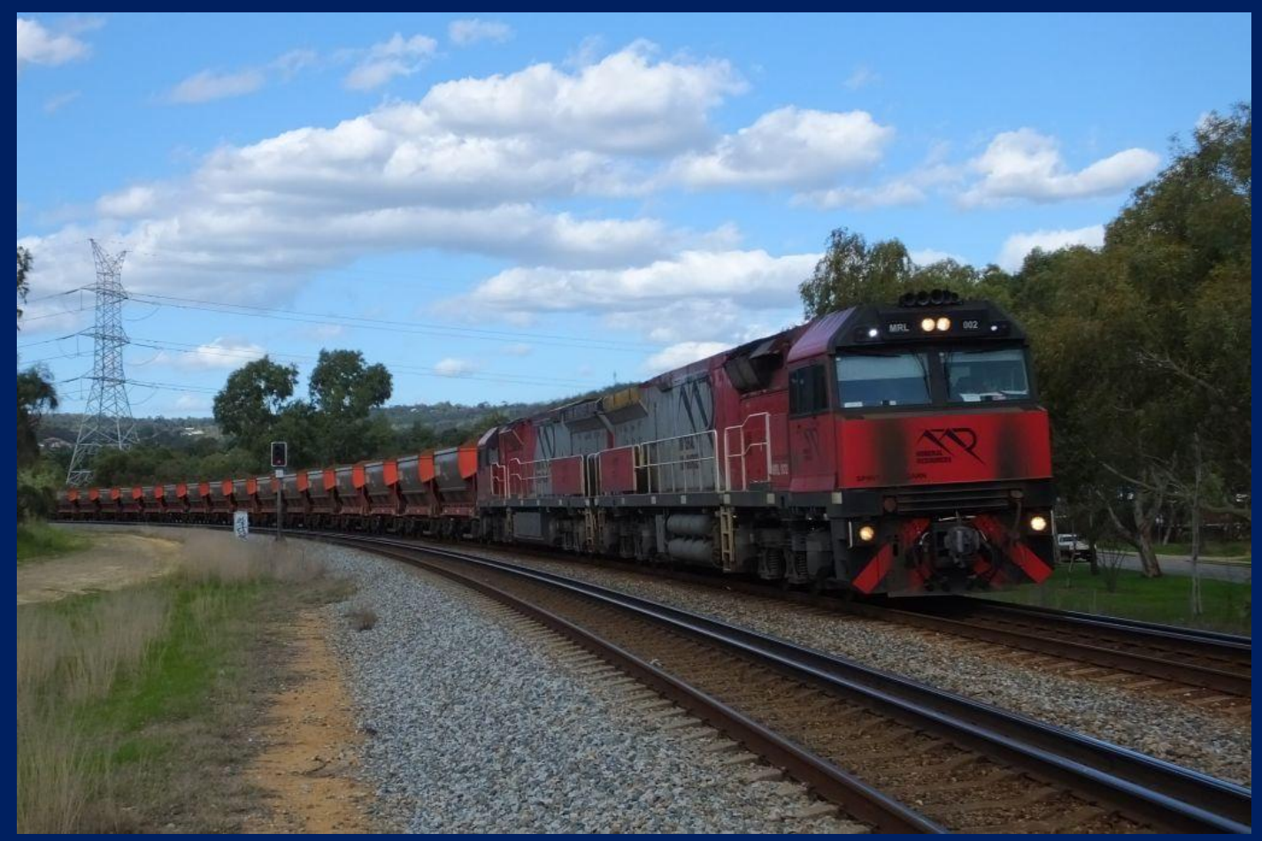
MRL002 & MRL003 on 6030 Polaris ore rounding curve at Bellevue August 18th.