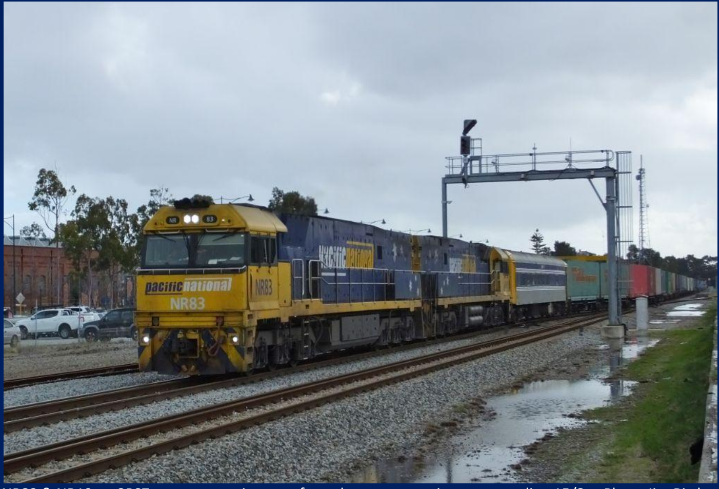
NR83 & NR19 on 3PS7 express crossing over from down to up main run wrong line 15/8.