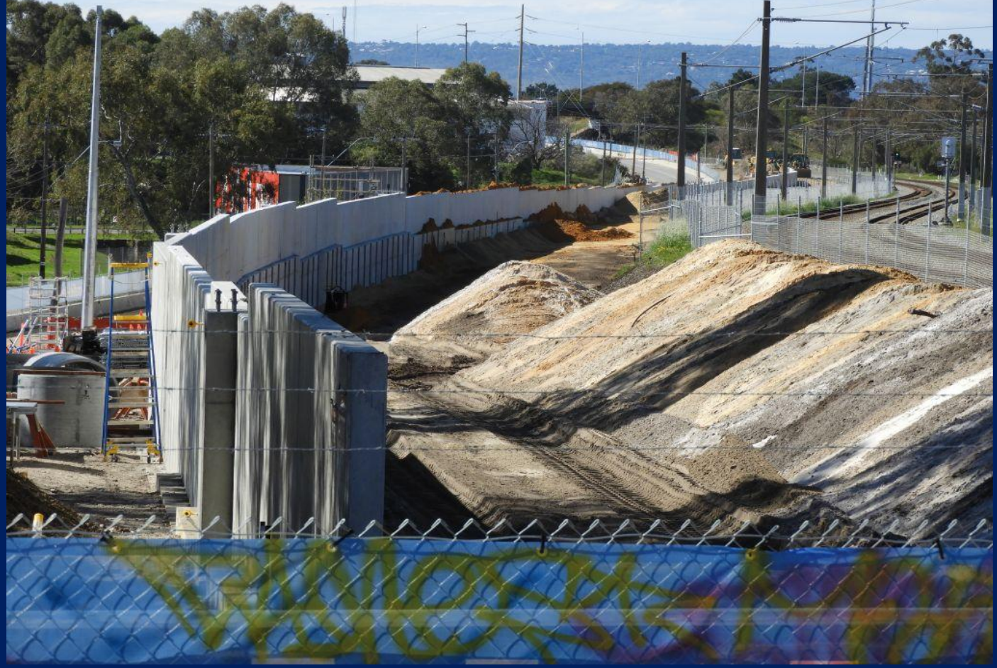
Retaining wall at Bayswater nearing completion to allow line be moved over 27/8.