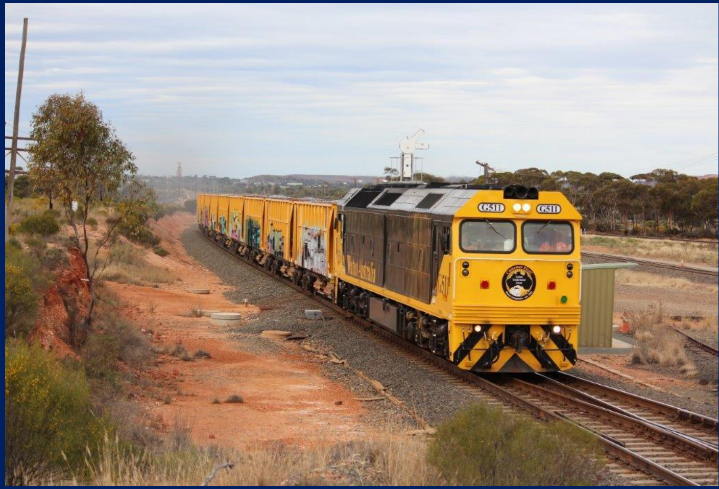
G511 on 5BT4 empty ballast from Leonora line enters West Kalgoorlie 24/8.