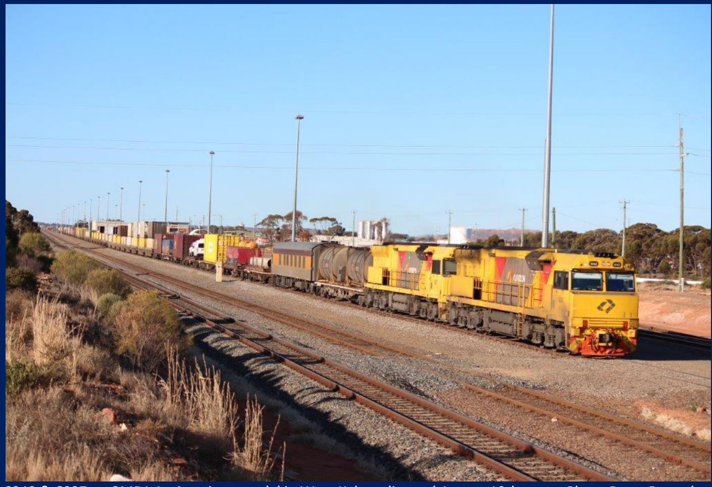
6042 & 6027 on 3MP1 Aurizon intermodal in West Kalgoorlie yard August 10th.