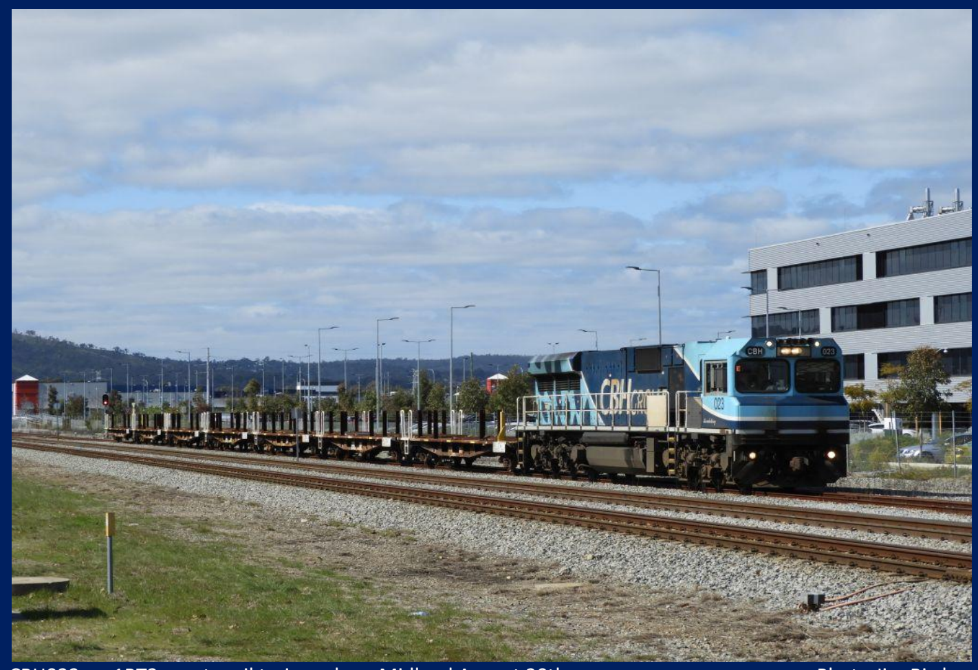
CBH023 on 1RT2 empty rail train on loop Midland August 20th.