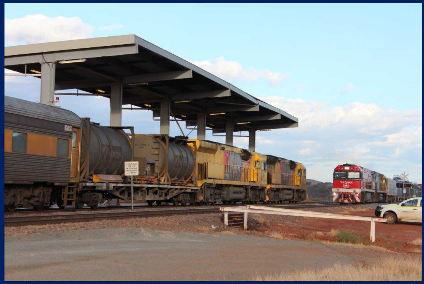
6026 & 6027 on 7PM1 crossing NR75 & NR47 on 5MP7 Parkeston August 19th.