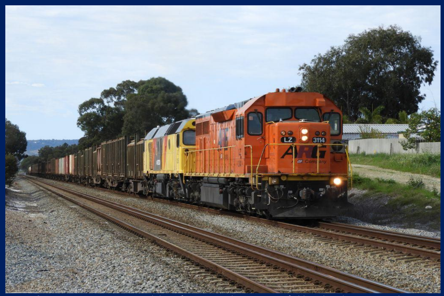
LZ3114 & DC2205 on 1430 empty sulphur after engine change Forrestfield at Thornlie August 28th.