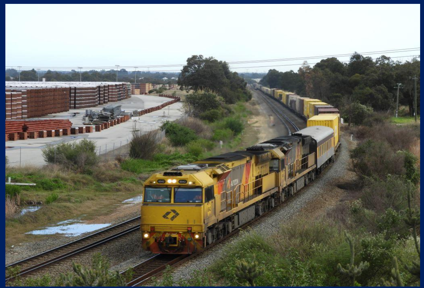
6042 & 6024 on late 5MP1 Aurizon intermodal South Guildford August 20th.