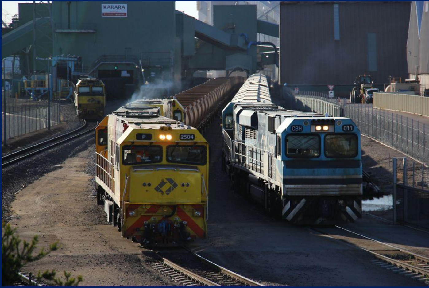
ACN4141 DPU on Karara ore unloading, P2504, P2514 & P2506 on Mt Gibson ore unloading, CBH011 & CBH008 on empty Watco grain at Geraldton Port August 11th.