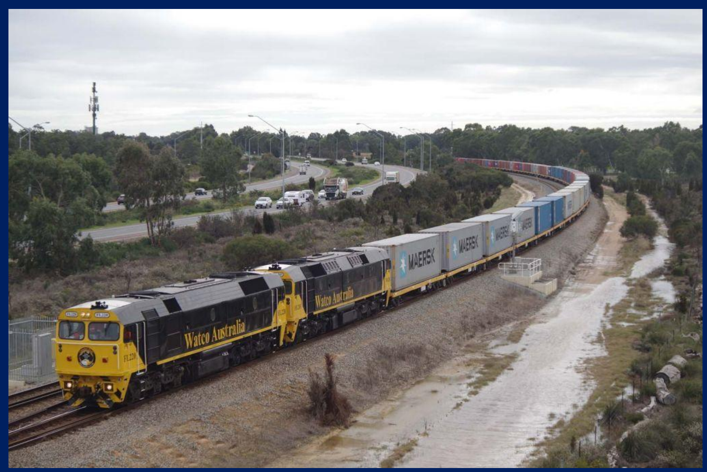
FL220 & HL203 on 6142 Watco port shuttle at Kenwick Junction August 13th.