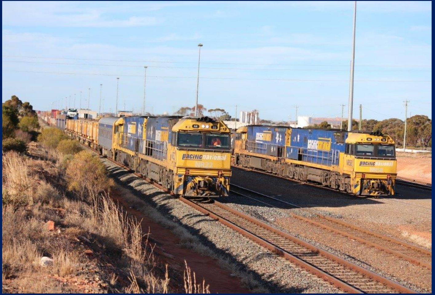
NR22 & NR121 on 2MP5 combined steel and intermodal with 4445 in WEK yard 23/8.