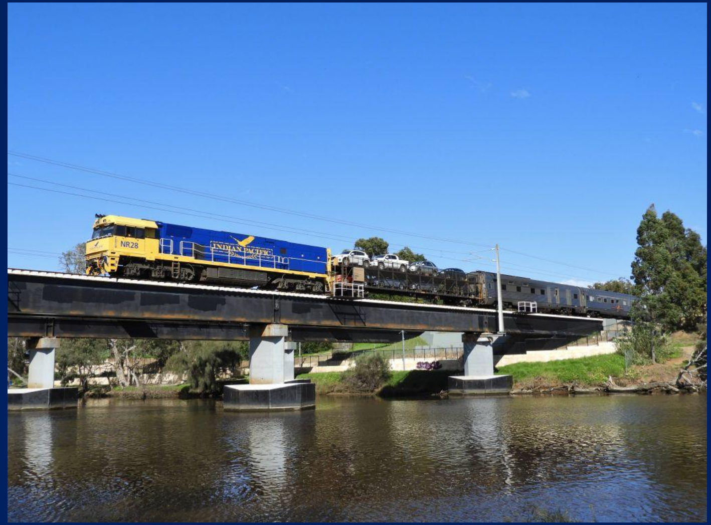
NR28 on 1PA8 Indian Pacific crossing Swan River at Guildford August 27th.