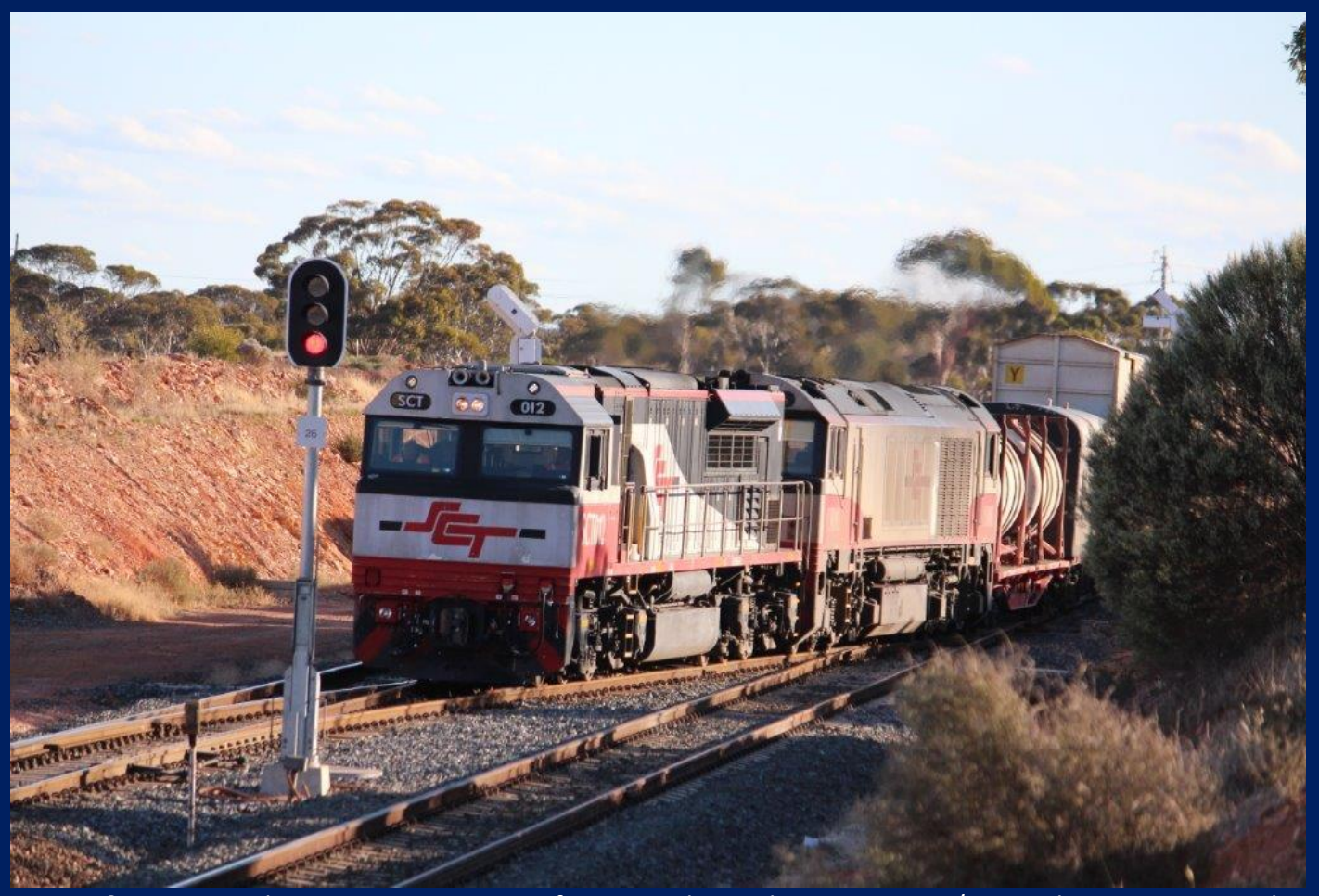
SCT012 & CSR003 on late 3PG1 crossing over from main line to loop at WEK 23/8.