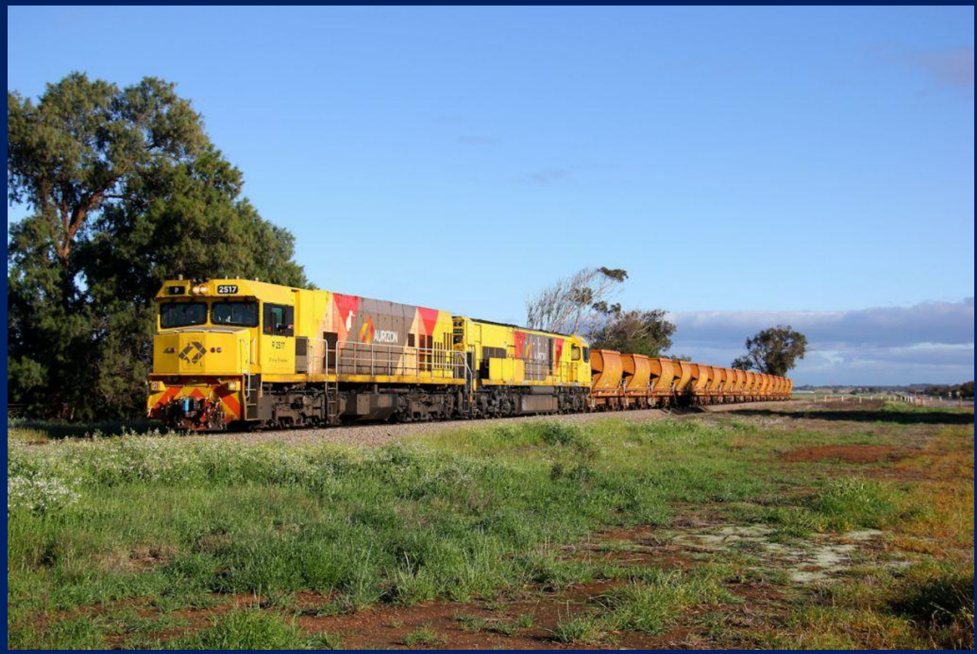
P2517 & ACN4144 on 5754 locomotive and wagon transfer with 8x2pack AHCF wagons Narngulu to Forrestfield at Georgina August 31st.