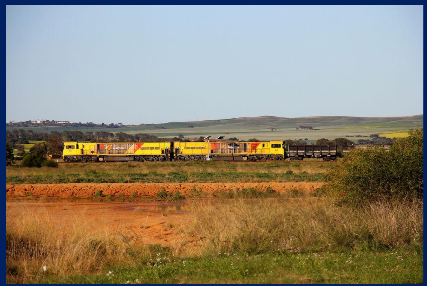
ACN4150 & ACN4142 on empty Karara ore ready to depart Narngulu East August 2nd.