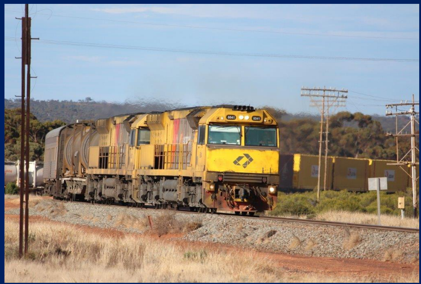
6041 & 6021 on 5MP1 Aurizon intermodal rounding curve departing Parkeston 12/8.