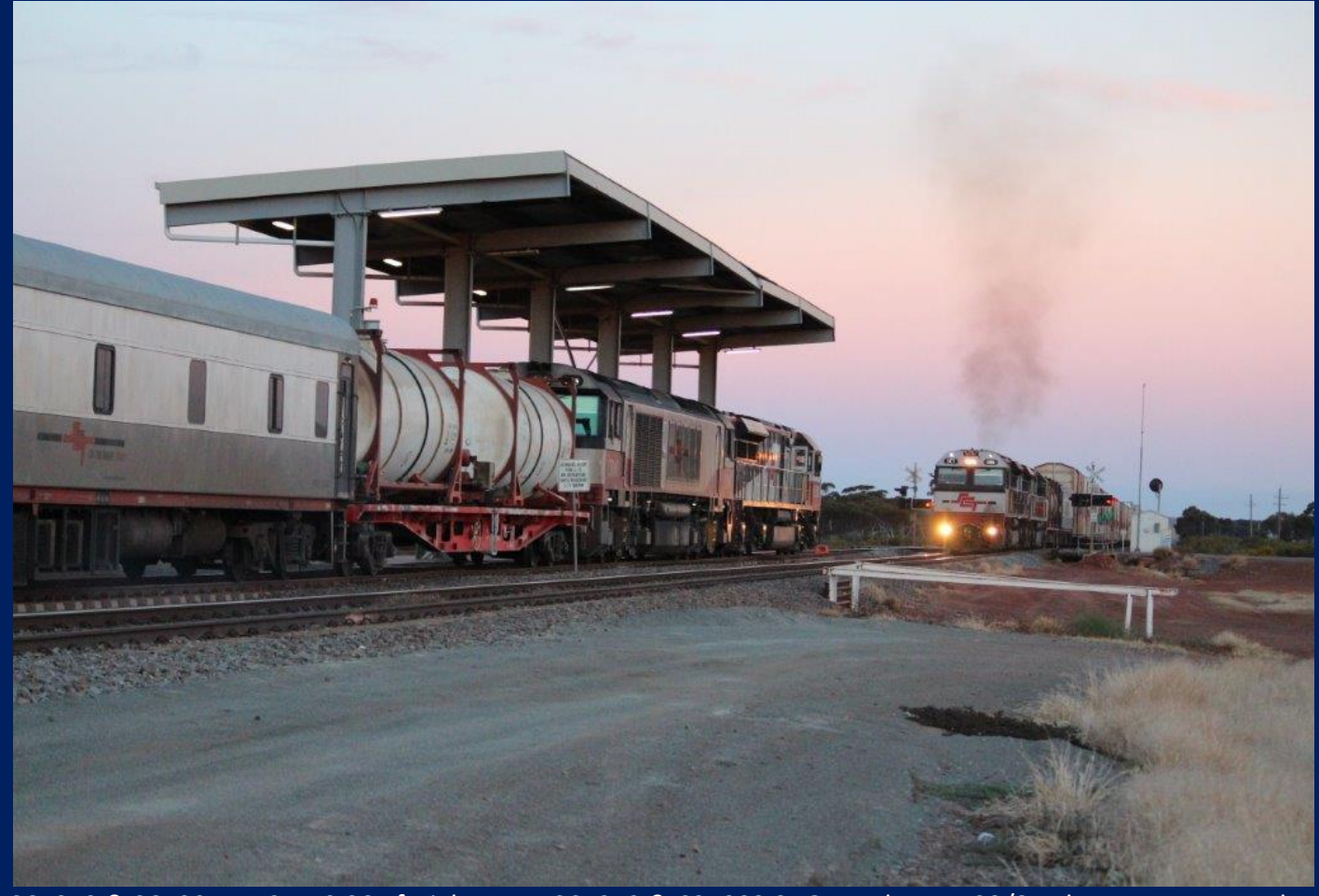
SCT013 & SCT004 on 2MP9 SCT freight cross SCT012 & CSR003 3PG1 Parkeston 23/8.