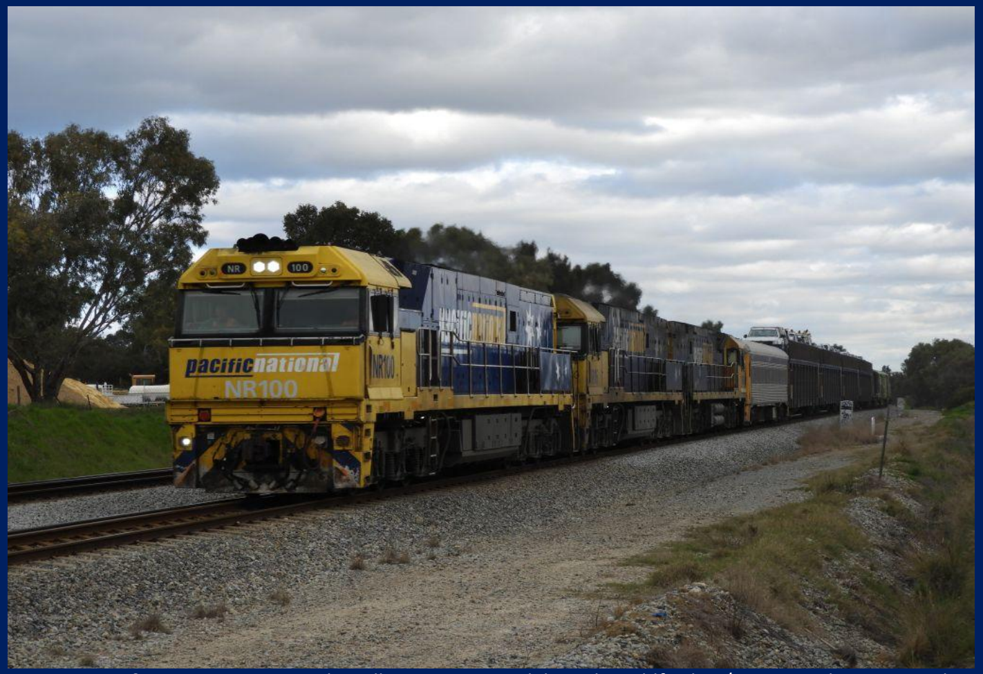
NR100, NR16 & NR88 on 7PM5 Perth Melbourne intermodal South Guildford 26/8.