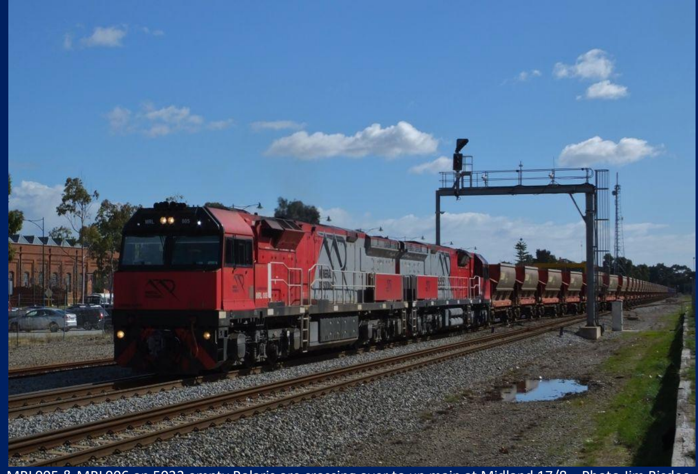
MRL005 & MRL006 on 5033 empty Polaris ore crossing over to up main at Midland 17/8.