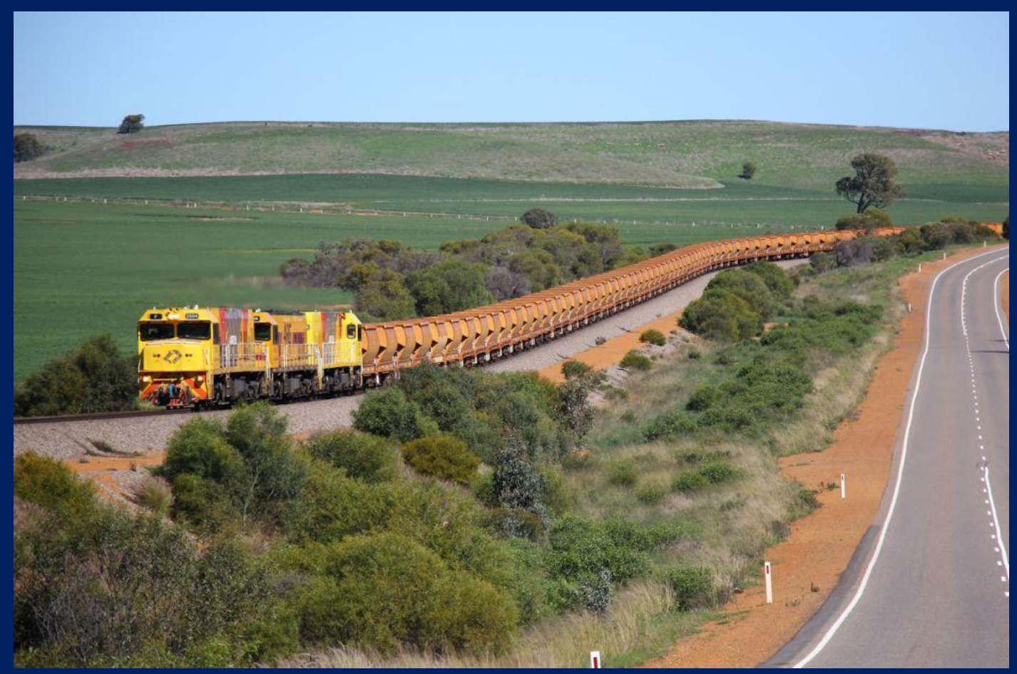
P2504, P2514 & P2506 on 6720 empty Mt Gibson ore to Perenjori at Moonyoonooka August 18th.