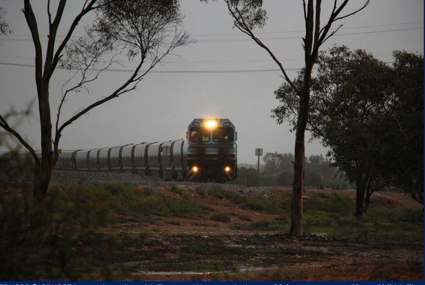
CBH008 & CBH007 in pouring rain at Mullewa on Watco grain August 29th.