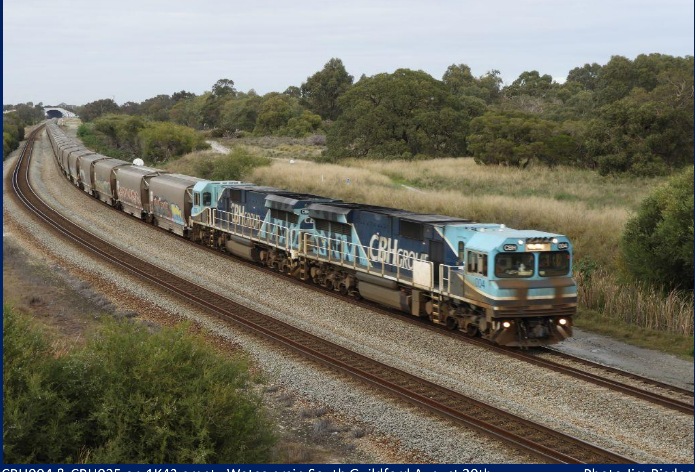
CBH004 & CBH025 on 1K43 empty Watco grain South Guildford August 20th.