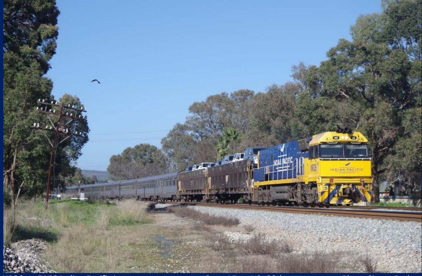
NR26 on 5AP8 Indian Pacific interstate passenger at Swan View July 30th.