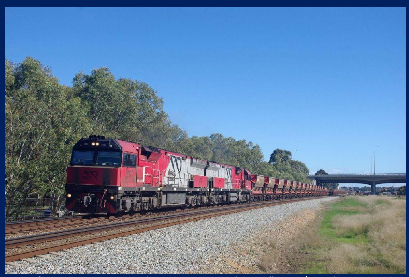
MRL003 & MRL004 on 5033 empty Polaris ore running wrong line at Bellevue 27/7.