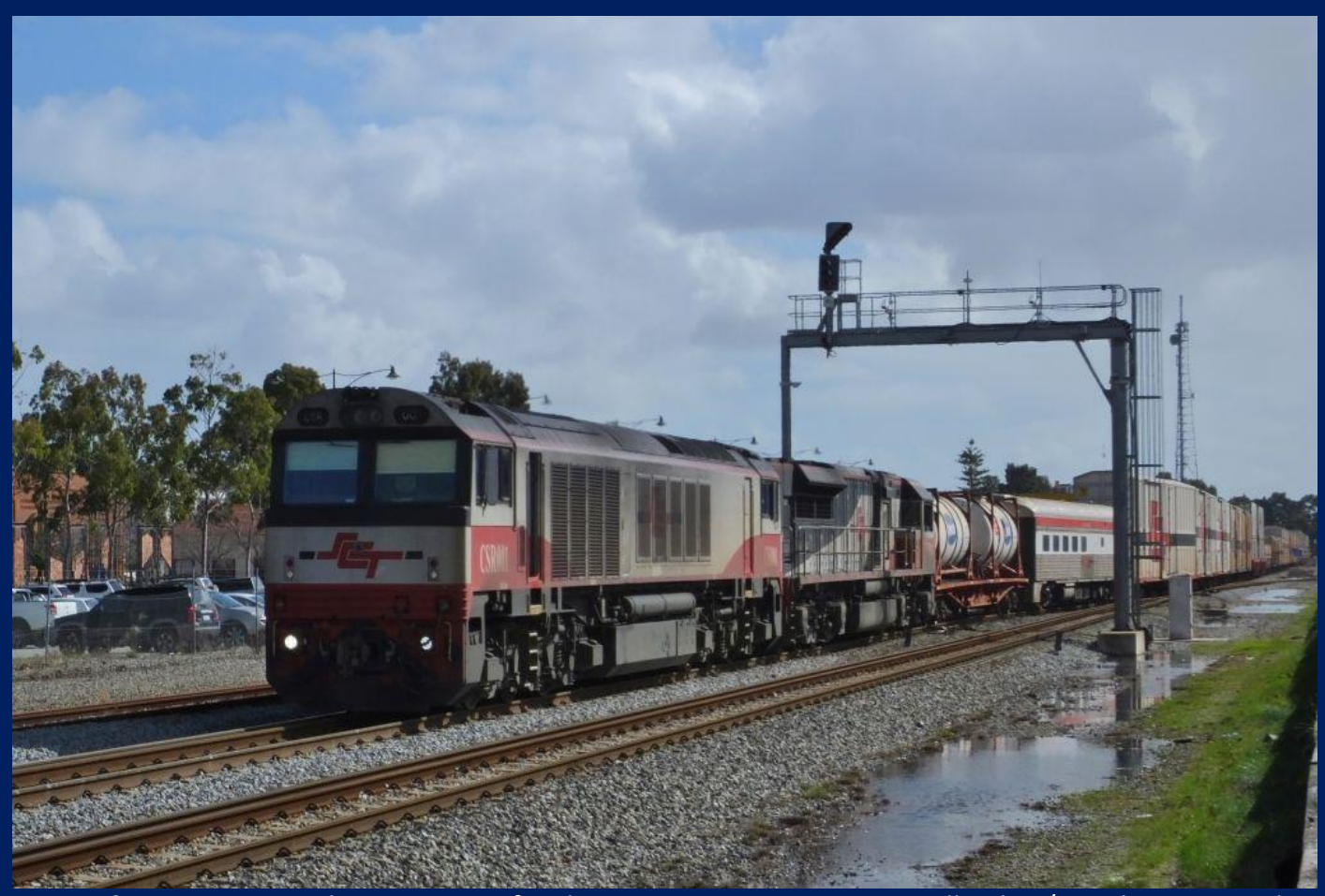
CSR001 & SCT004 on very late 2PM9 SCT freight crossing over to up main Midland 15/8.