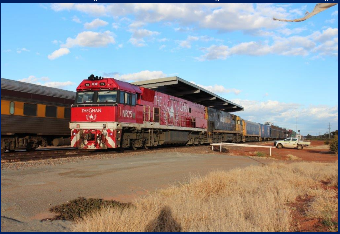
NR75 & NR47 on 5MP7 [combined 5MP5/5MP7] entering Parkeston August 19th.