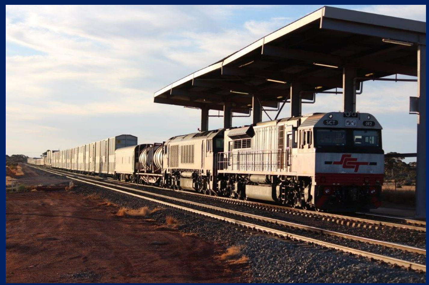
SCT012 & CSR003 on late 3PG1 at sunset Parkston refueling [inline fueling u/s] 23/8.