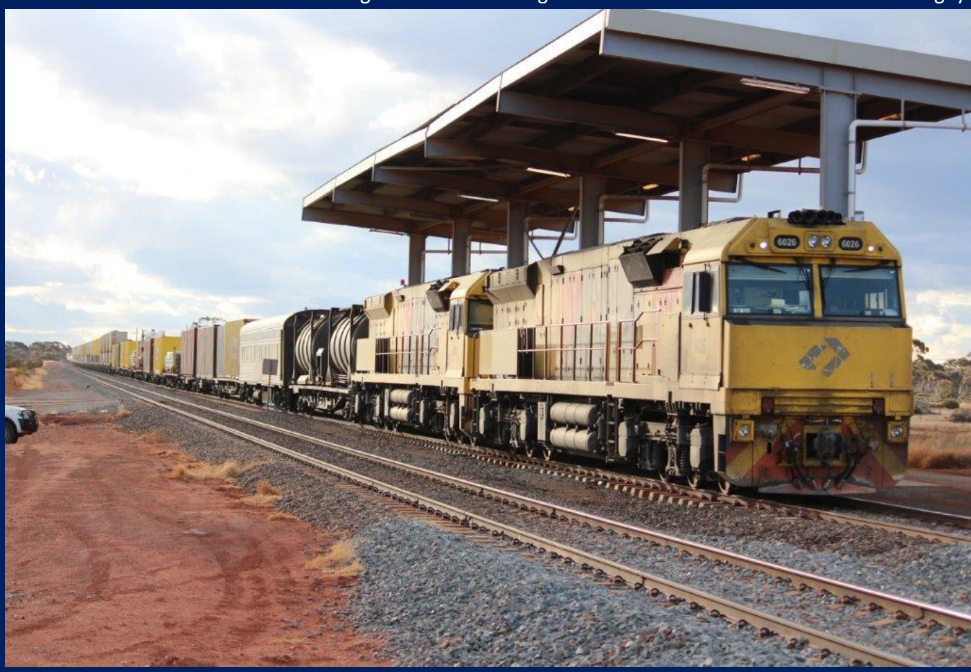
6026 & 6027 on 7PM1 at Parkeston waiting to cross 5MP7 August 19th.