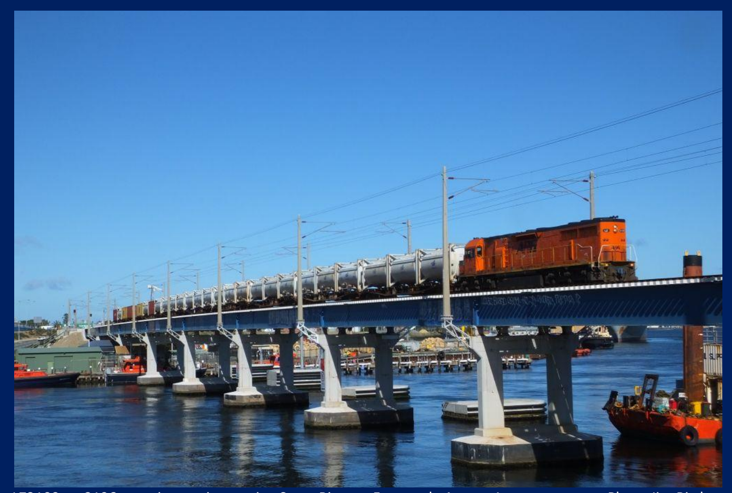
LZ3109 on 3196 container train crossing Swan River at Fremantle August 1st.