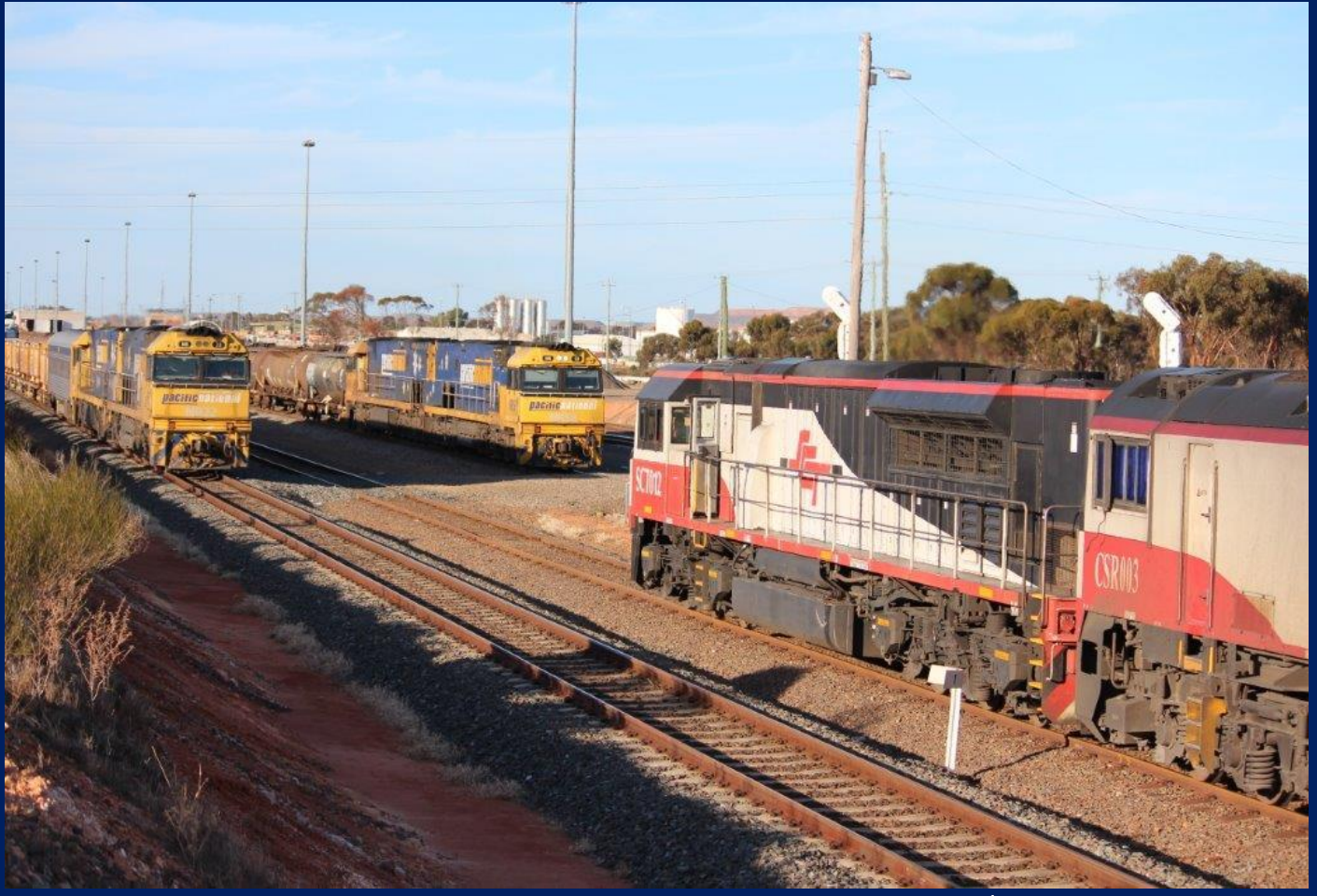
SCT012 & CSR003 on 3PG1 on loop about to pass between 2MP5 & 4445 WEK 23/8.