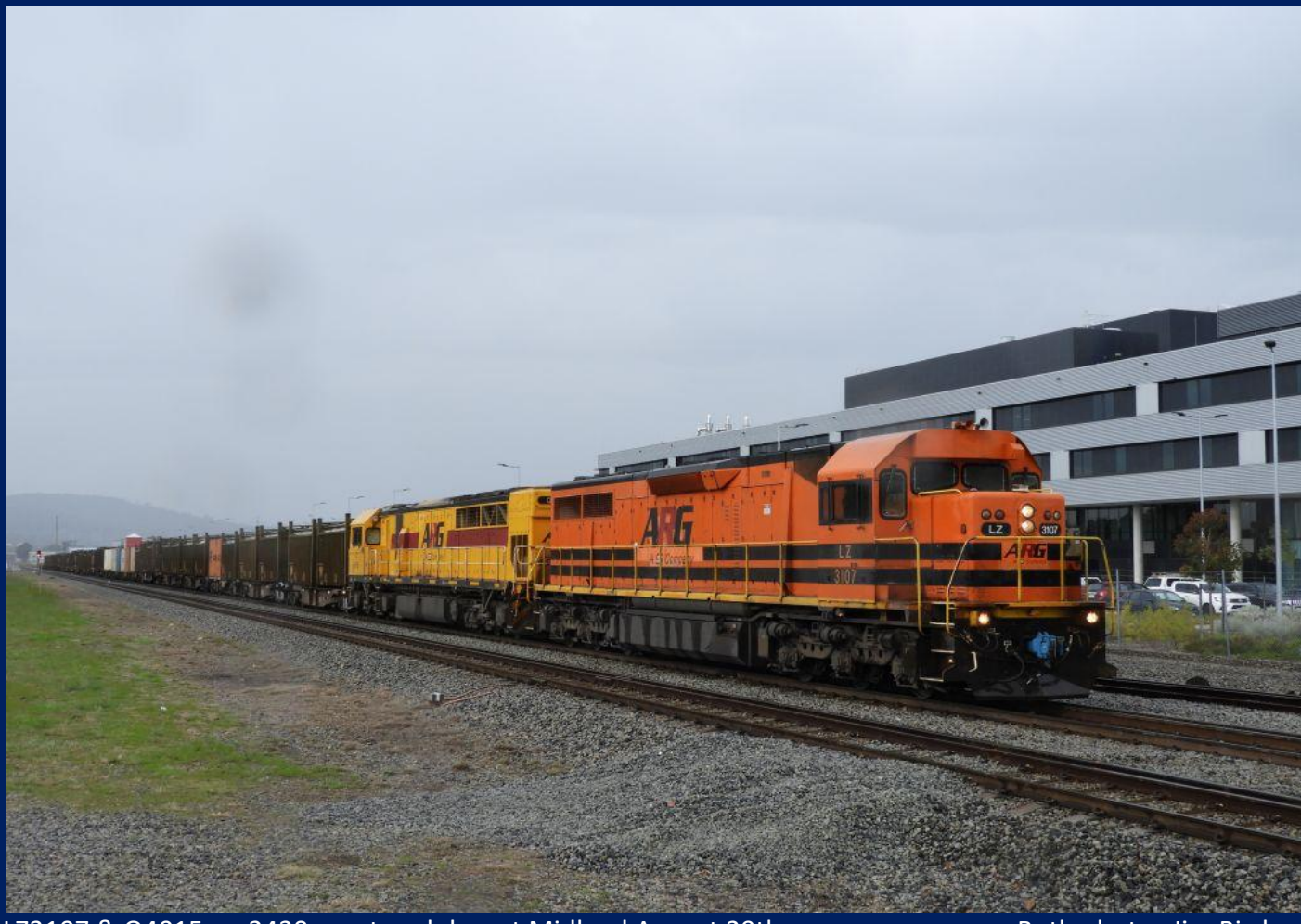
LZ3107 & Q4015 on 2430 empty sulphur at Midland August 29th.