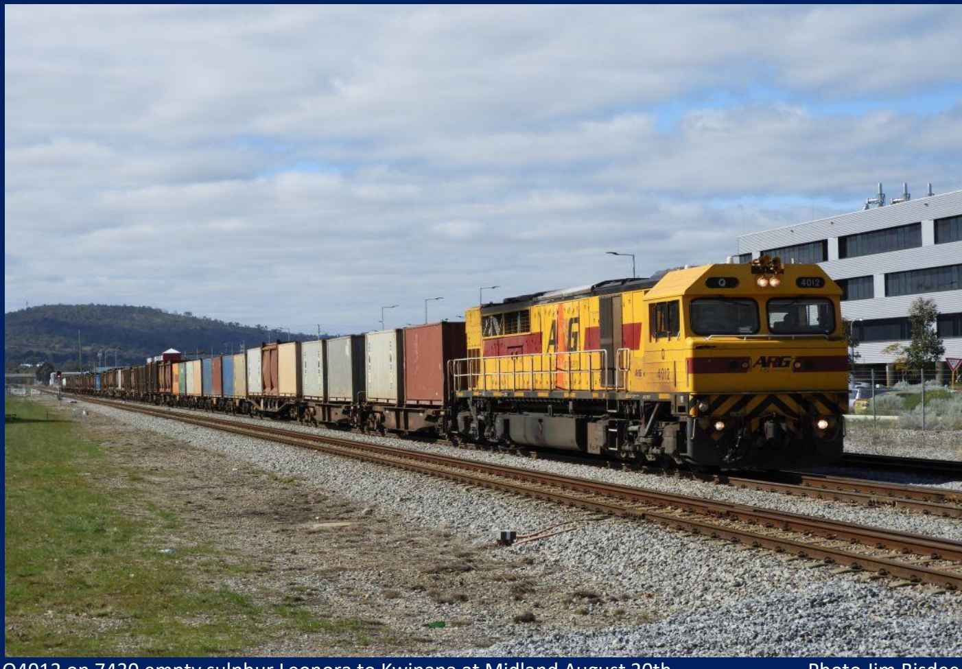
Q4012 on 7430 empty sulphur Leonora to Kwinana at Midland August 20th.