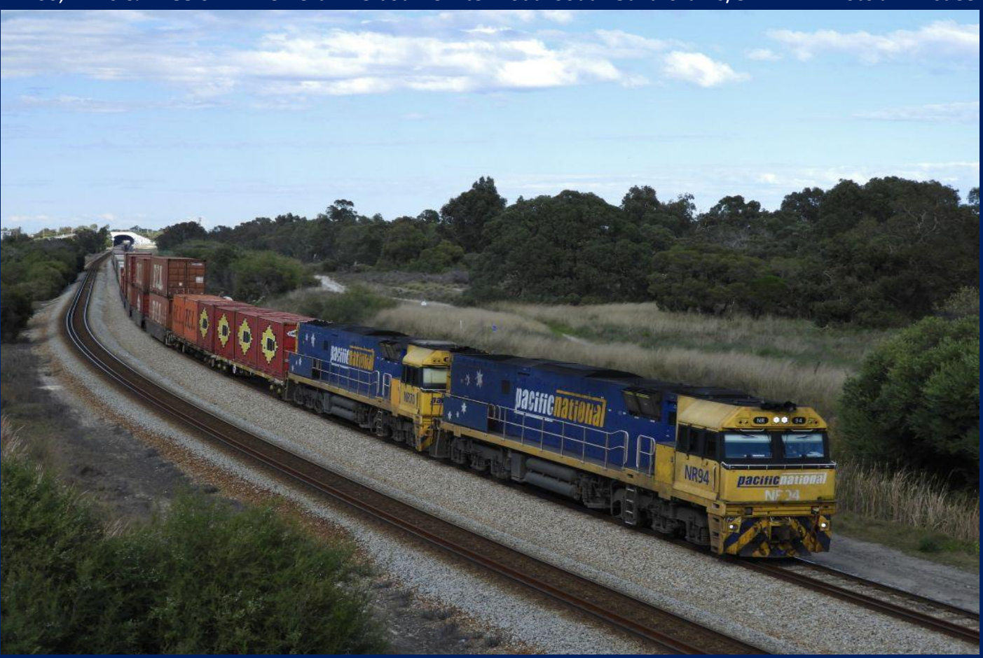
NR94 & NR70 on 1PS6 Perth Sydney Intermodal South Guildford August 27th.