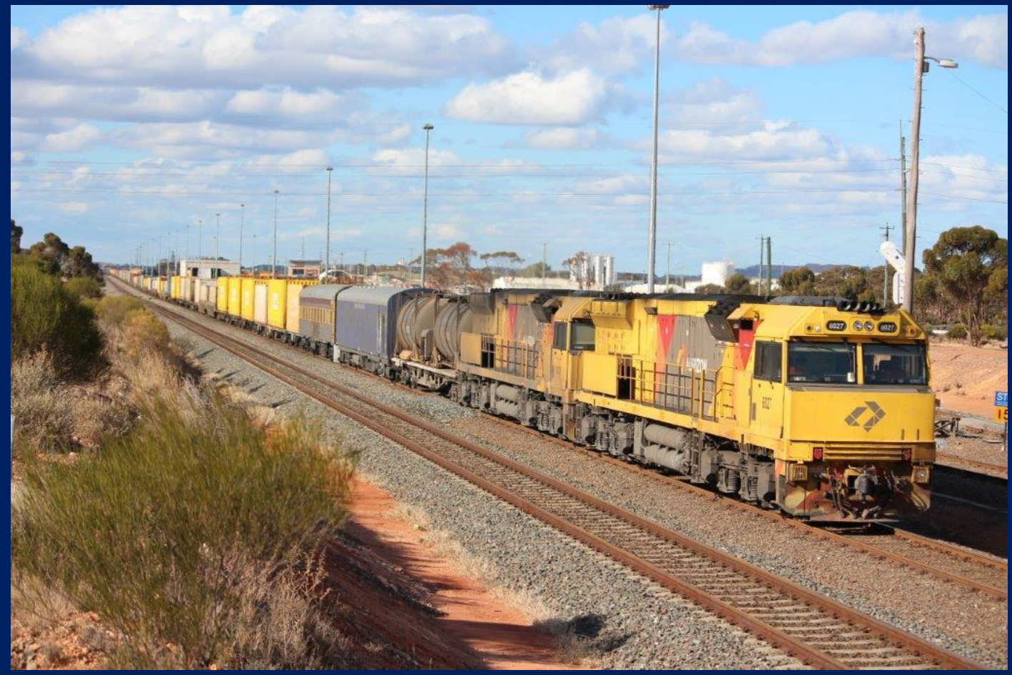
6027 & 6026 on 5MP1 Aurizon intermodal with two crew cars WEK 26/8.