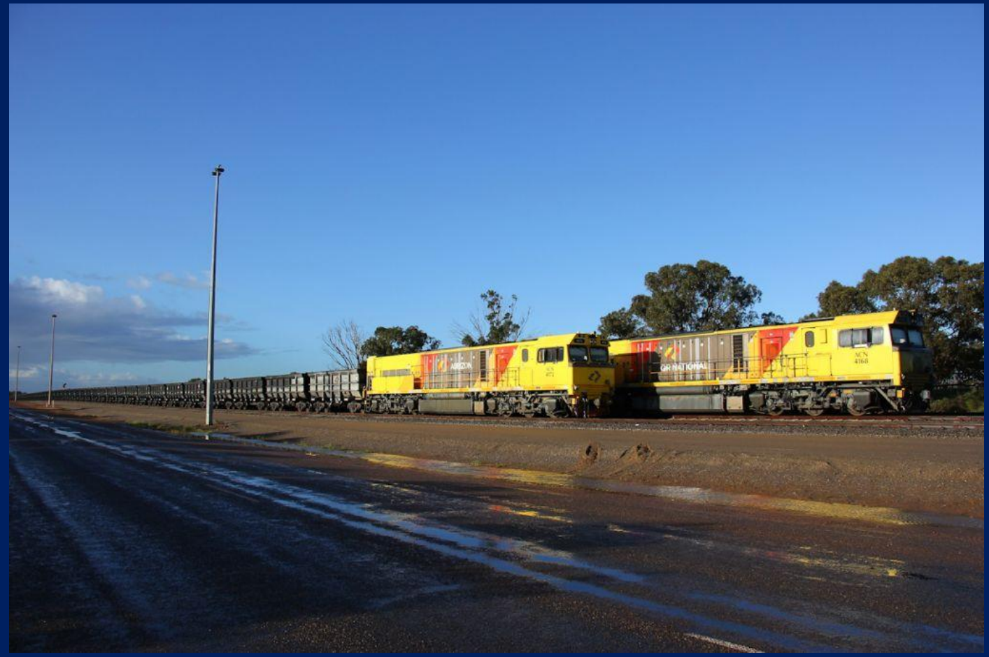
ACN4172 and ACN4168 stabled on empty Karara ore rakes Narngulu August 13th.