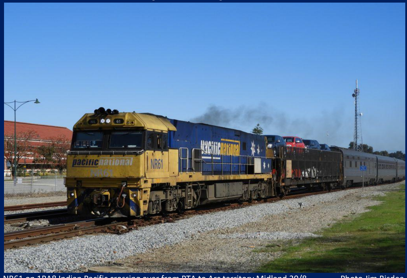
NR61 on 1PA8 Indian Pacific crossing over from PTA to Arc territory Midland 20/8.