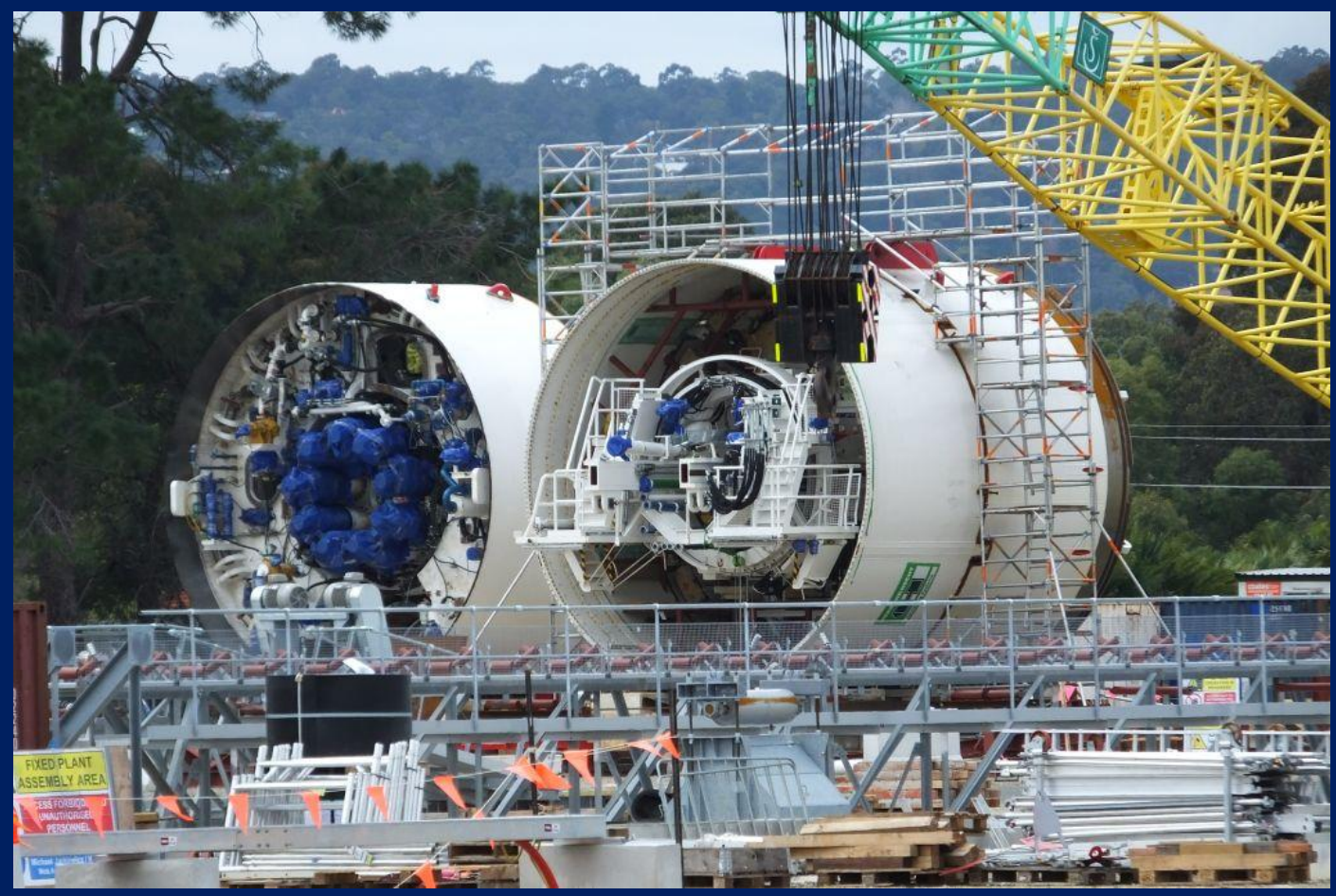
Second tunnel boring machine being assembled for use on Forrestfield line August 6th.