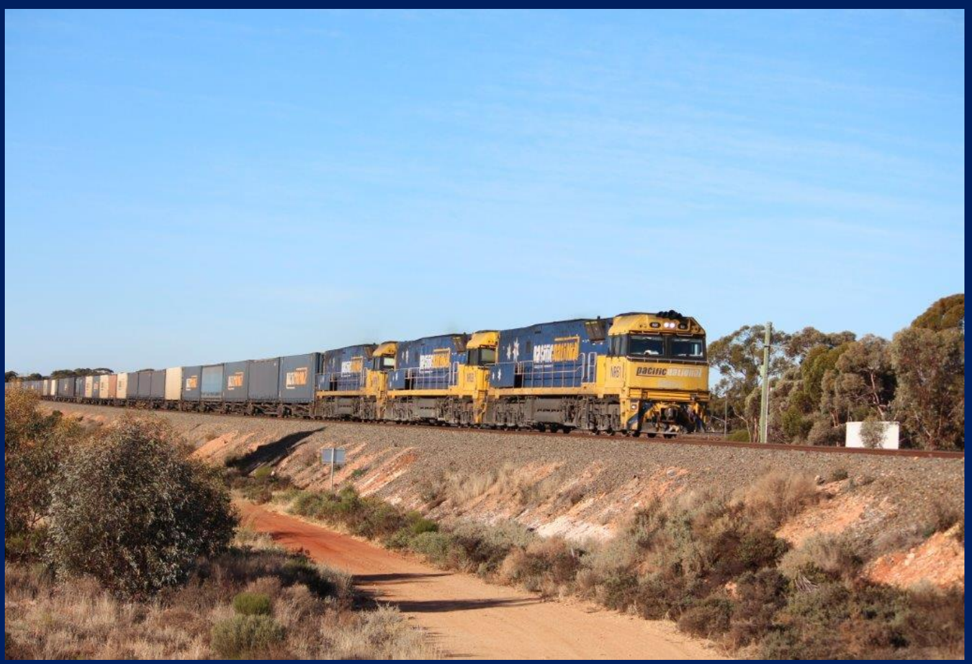
NR61, NR83 & NR19 on 6SP7 Sydney Perth express thru Binduli August 6th.