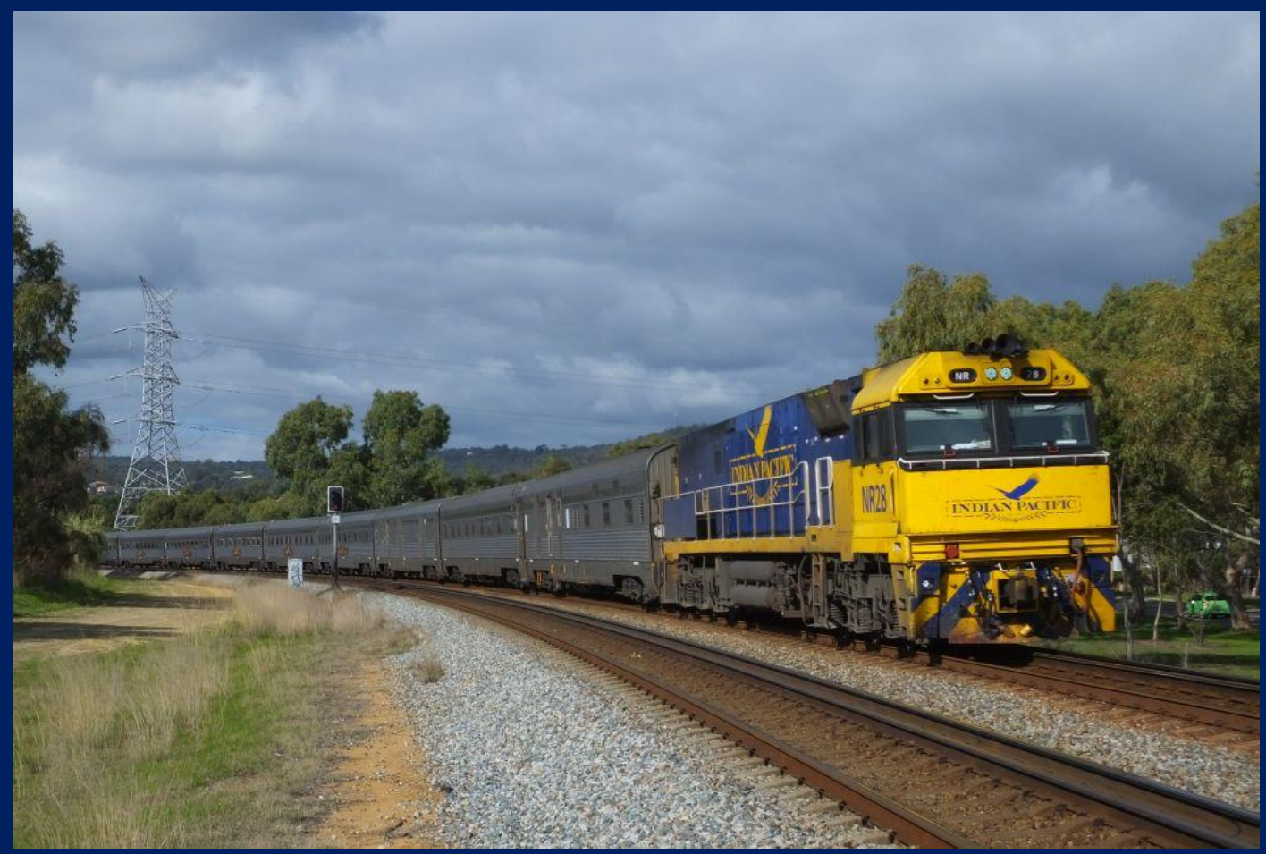
NR28 on 5AP8 Indian Pacific weekly passenger service Sydney to Perth at Bellevue 5/8.