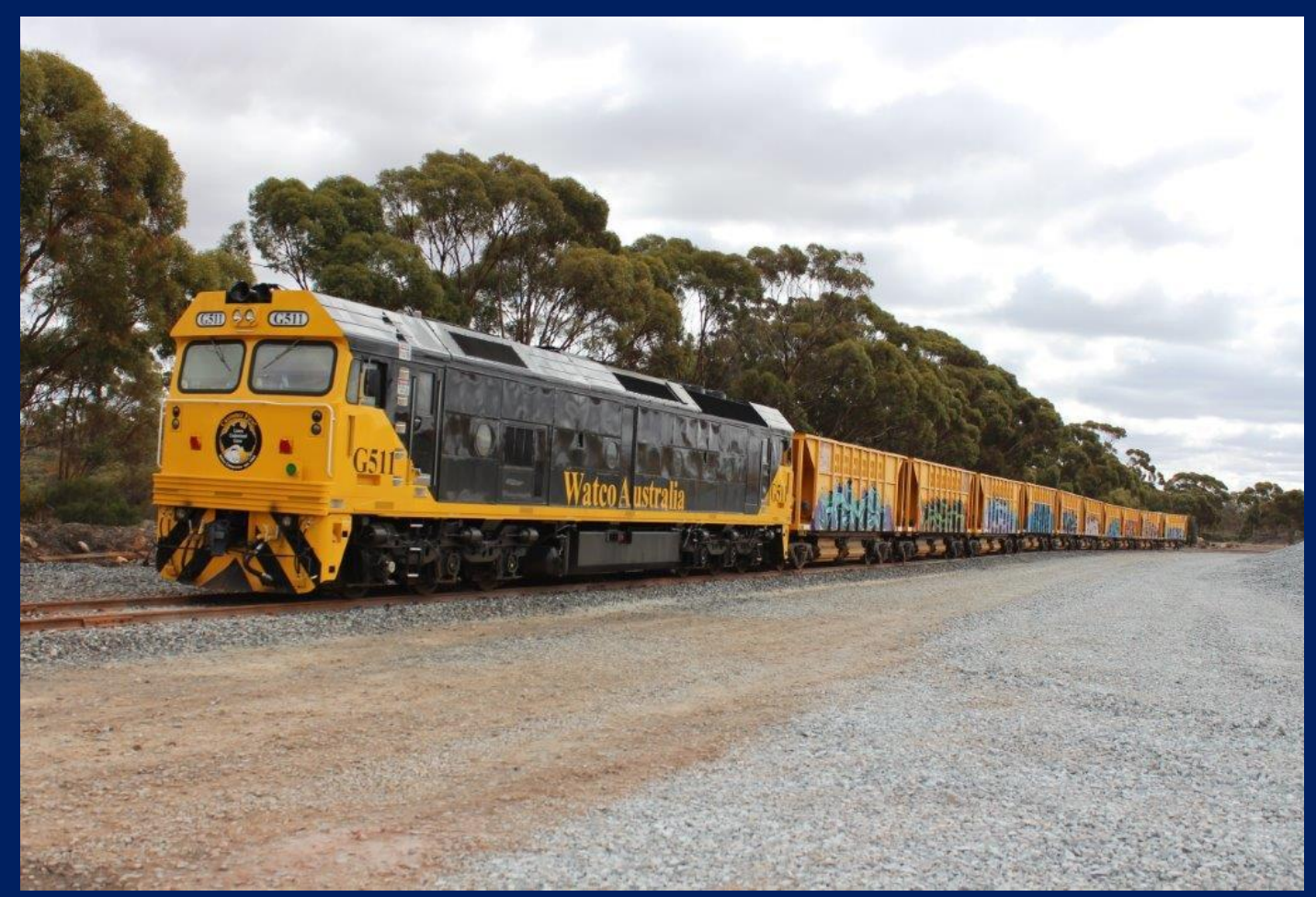
G511 stabled on 5x2pack CHAY ballast hoppers at Hampton ballast siding 20/8.