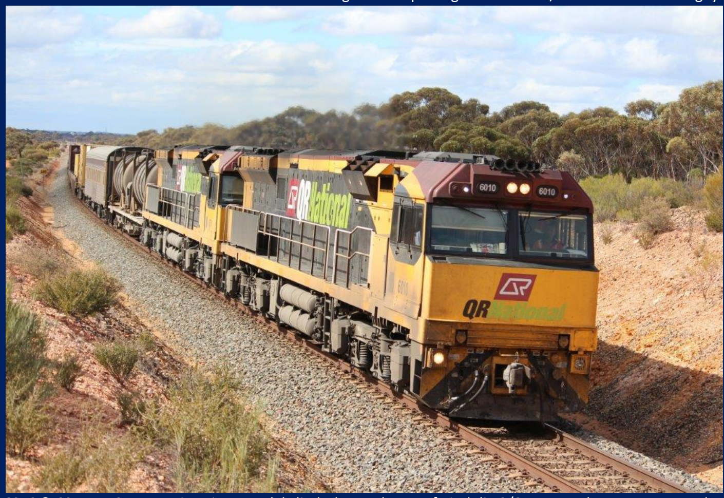
6010 & 6011 on 6MP1 Aurizon intermodal climb the grade out of Binduli 13/8.