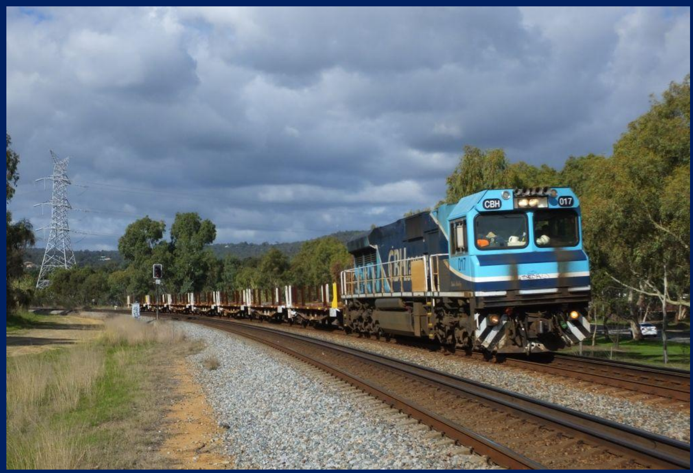
CBH017 on 7RT2 empty Watco rail train to Flashbutt yard Midland at Bellevue August 5th.