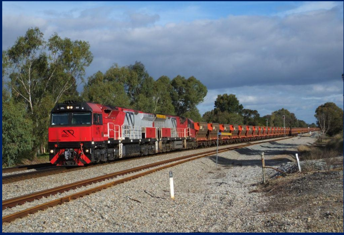
MRL005 & MRL002 on 7035 empty Polaris ore to Mt Walton at Woodbridge August 5th.