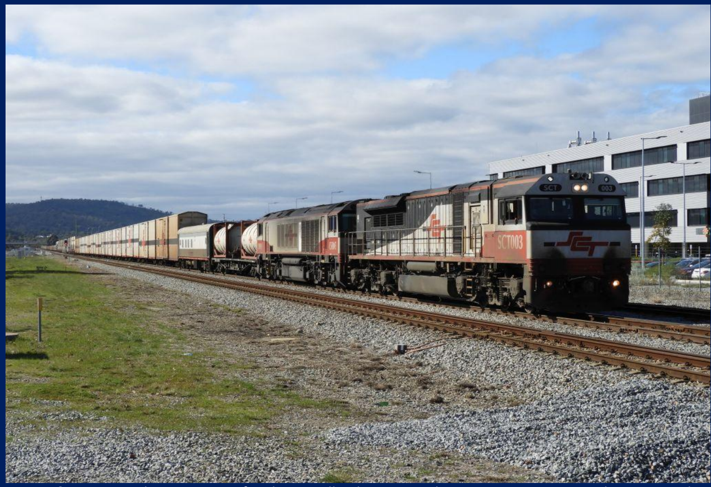
SCT003 & CSR003 on late 5MP9 SCT freight at Midland August 20th.