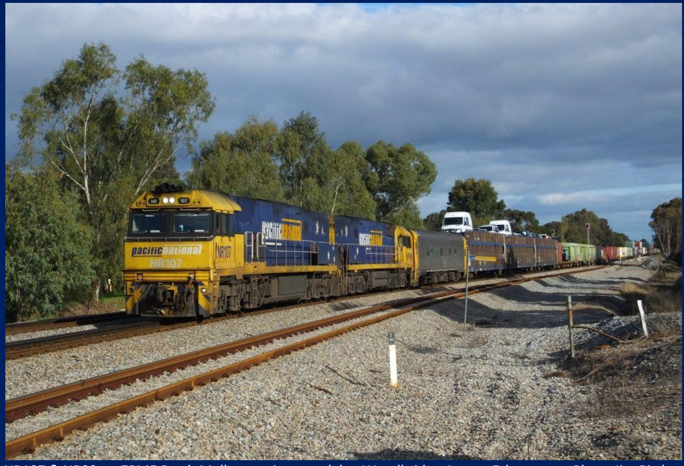
NR107 & NR93 on 7PM5 Perth Melbourne intermodal at Woodbridge August 5th.