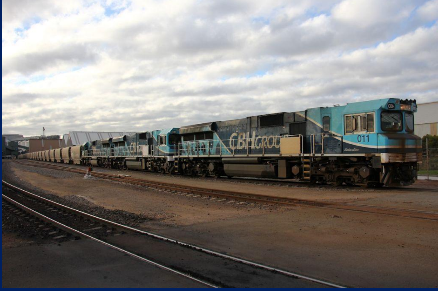
CBH011, CBH009 & CBH008 on empty Watco grain Geraldton Port August 3rd.