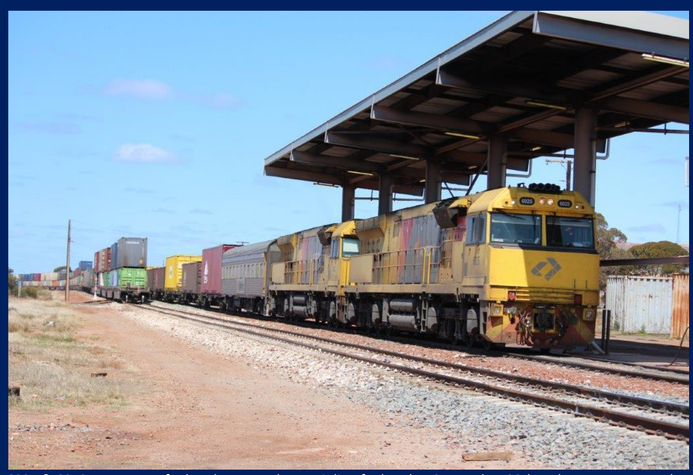
6025 & 6042 on 5MP1 refuel Parkeston as has no inline fuel tanker September 30th.