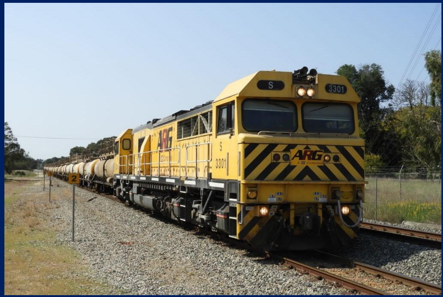
S3301 on 2237 caustic soda tankers in loop Mundijong September 18th.