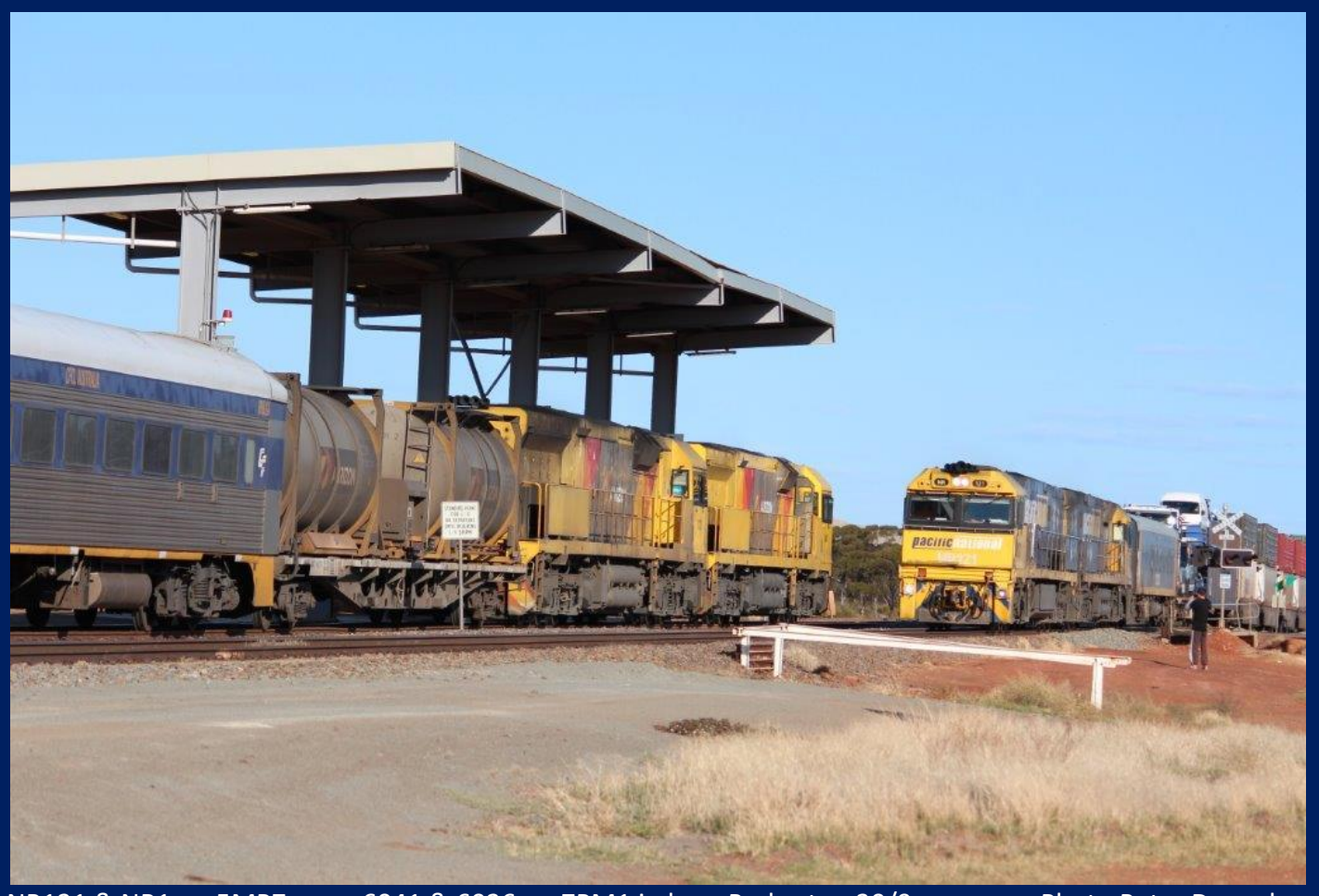
NR121 & NR1 on 5MP7 cross 6041 & 6026 on 7PM1 in loop Parkeston 30/9.