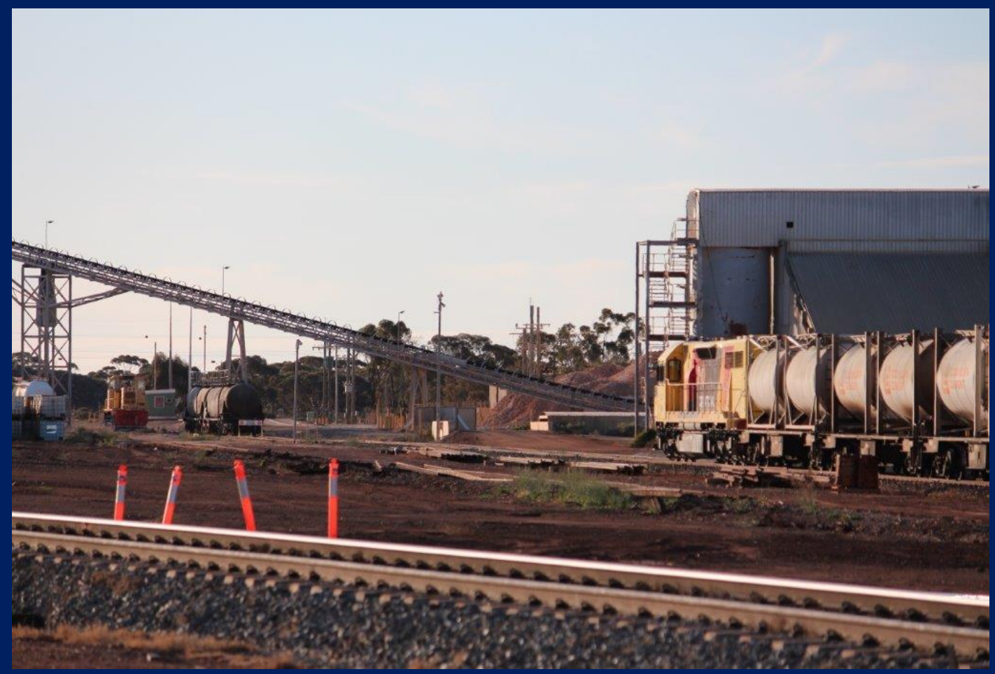
LZ3106 on C74 Parkeston shunter shunting Loongana Lime works September 6th.