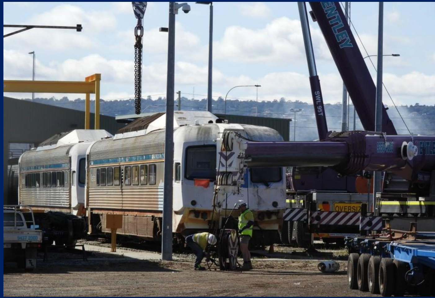
Prospector trailer car being prepared to be moved from PTA Kewdale September 29th.