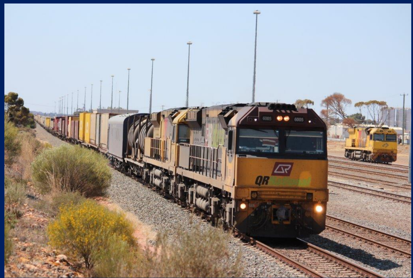
6005 & 6028 on 6MP1 Aurizon intermodal WEK yard with ACB4406 stabled 17/9.