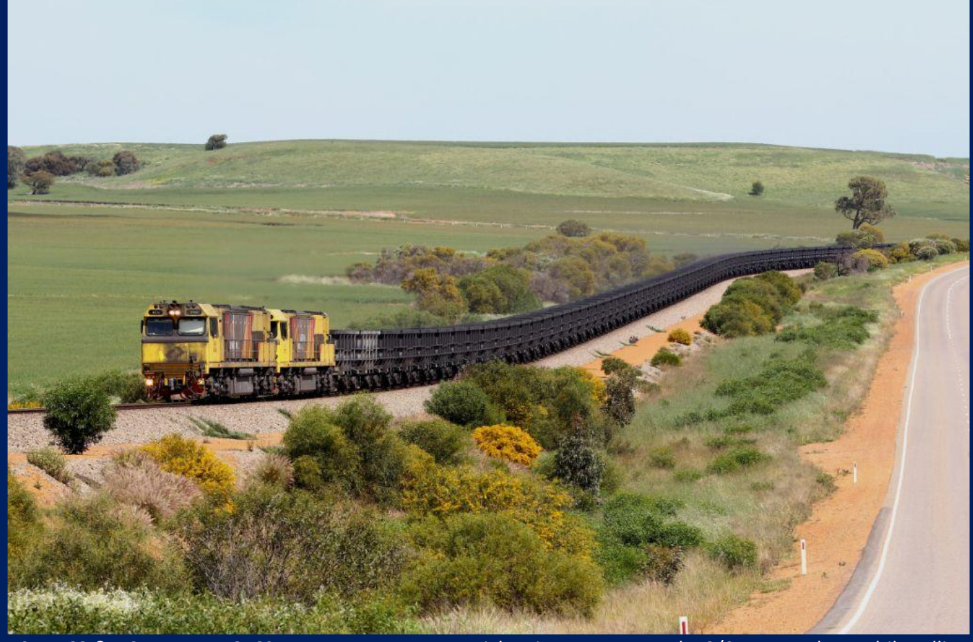
ACN4168 & ACN4171 on 6762 empty Karara ore at Micks Dip Moonyoonooka 8/9.