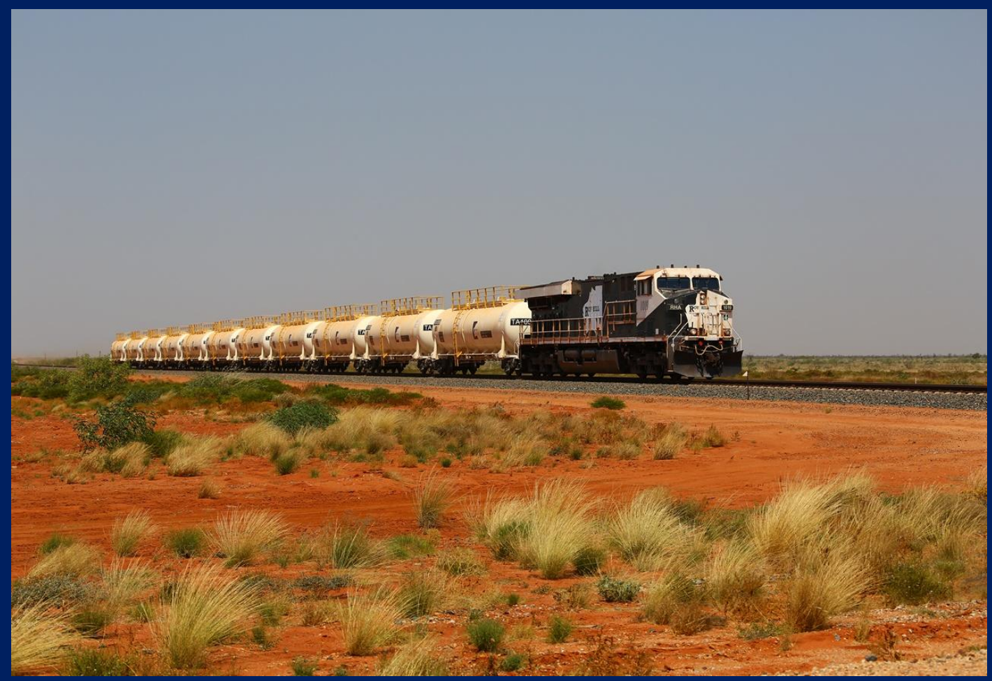
RHA1019 hauls 11 empty fuel tankers over Great Northern Highway crossing 15/9.