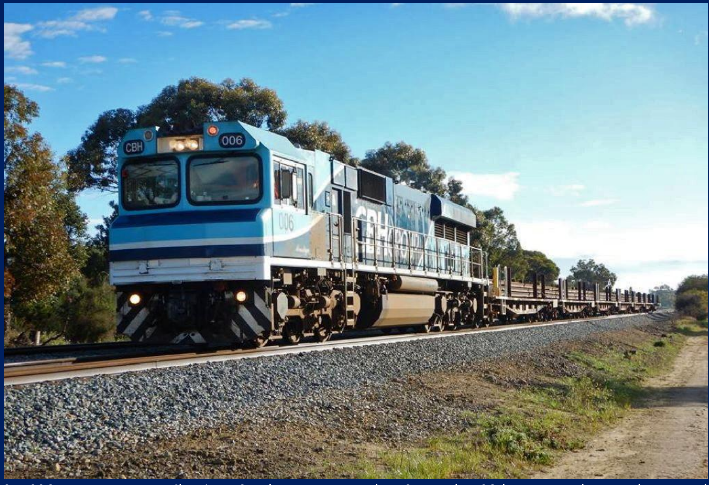
CBH006 on 5RT1 Watco rail train to South West at Yangebup September 28th.