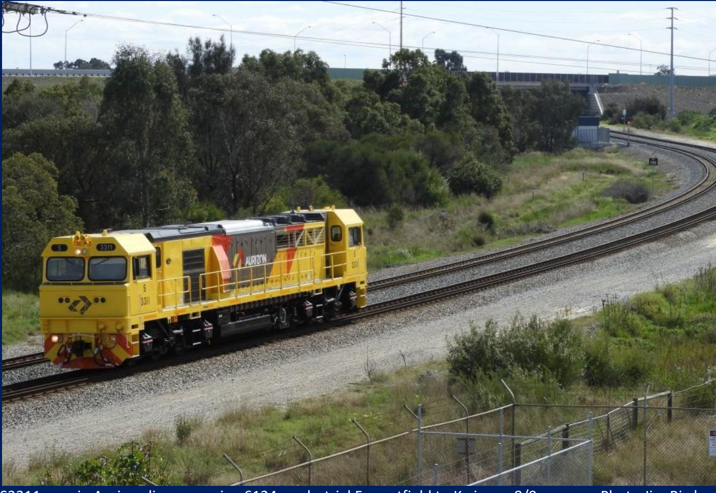
S3311 now in Aurizon livery running 6124 works trial Forrestfield to Kwinana 8/9.