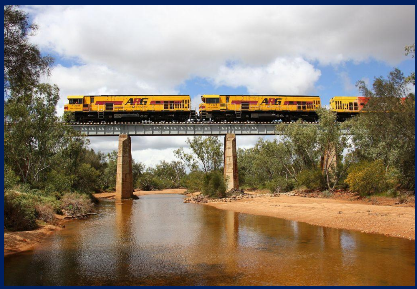
P2501, P2508 & P2517 on 2720 empty Mt Gibson ore crossing Greenough River Eradu 25/9.