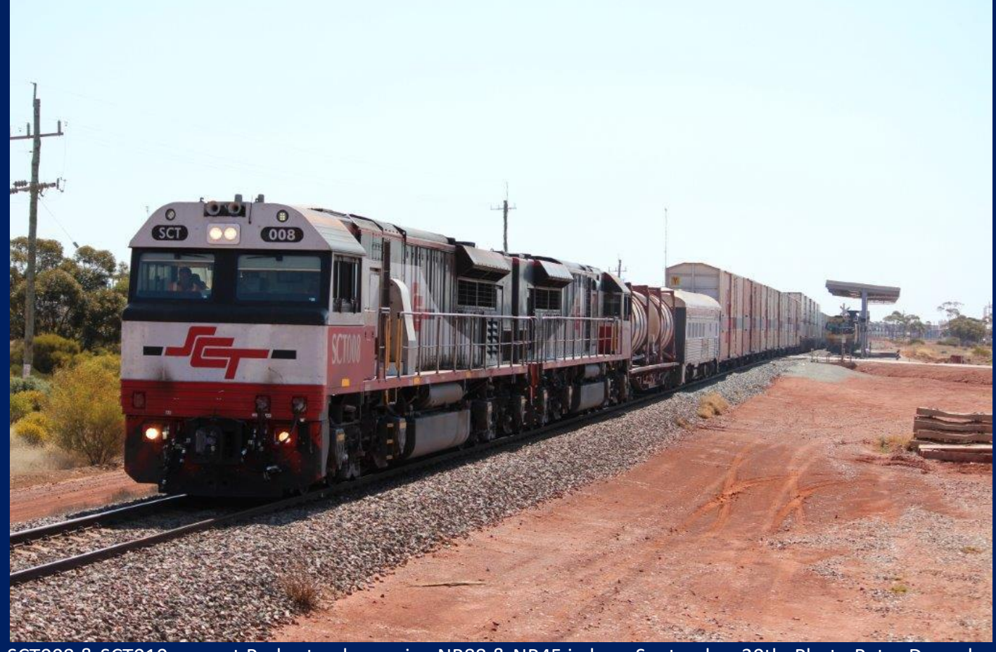
SCT008 & SCT010 run out Parkeston bypassing NR88 & NR45 in loop September 30th.