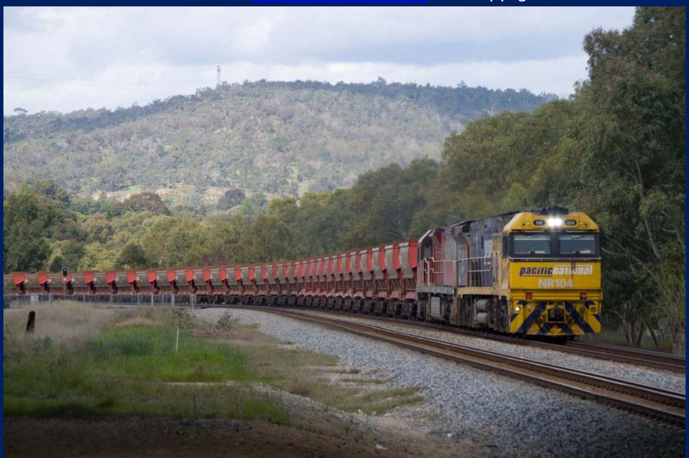
NR104 & MRL003 on 6030 Polaris ore at Bellevue September 8th.

Publisher: Jim Bisdee Email: pm1225@bigpond.com Copyright Jim Bisdee © 2017