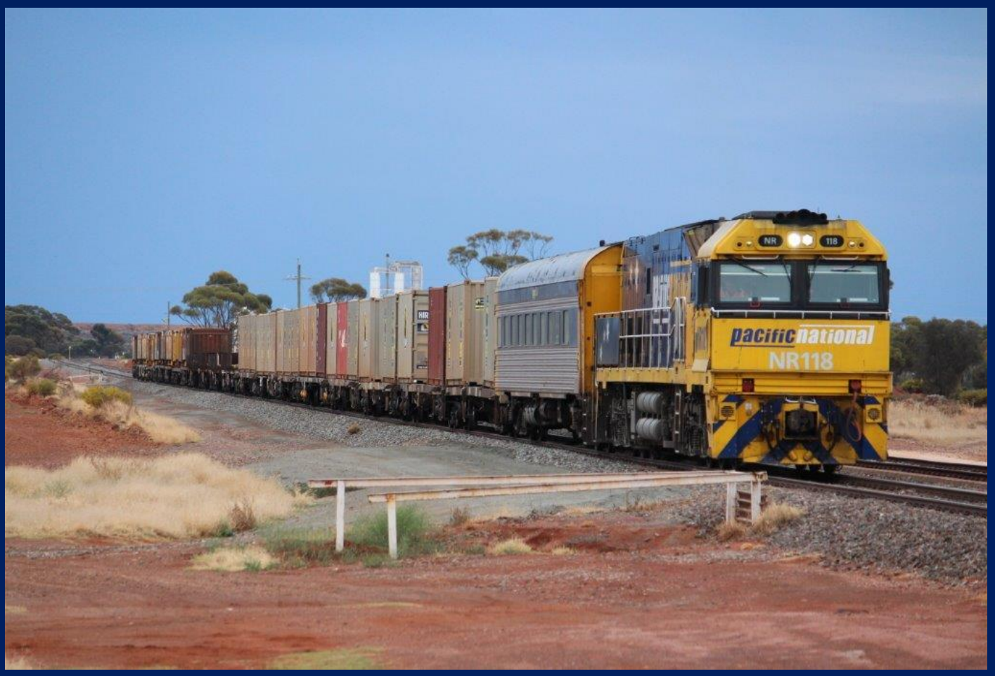
NR118 on 3PM4 steel train at Parkeston August 29th.