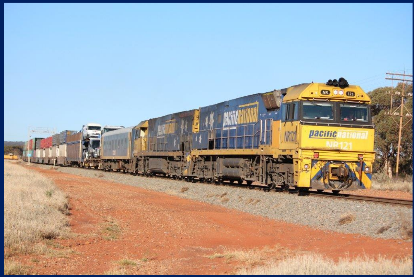
NR121 & NR1 highest and lowest NR numbers on 5MP7 depart Parkeston 30/9.