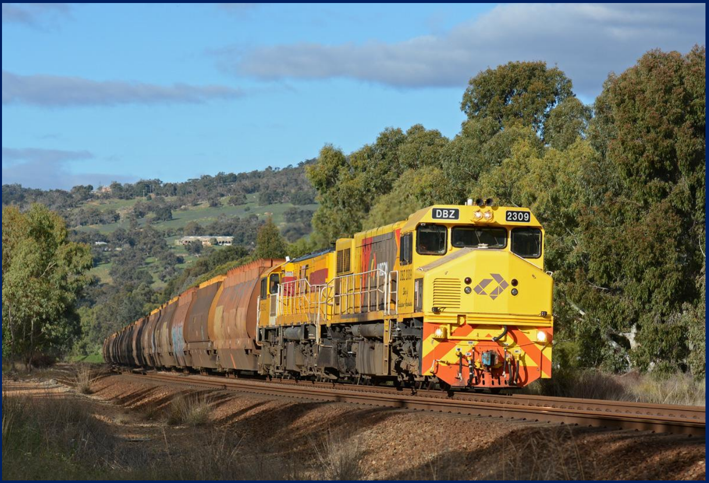
DBZ2309 & DFZ2404 on 2304 empty woodchip wagons Brigadoon 4/9.