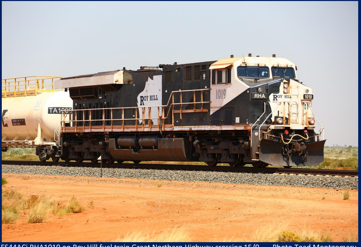
ES44ACi RHA1019 on Roy Hill fuel train Great Northern Highway crossing 15/9.