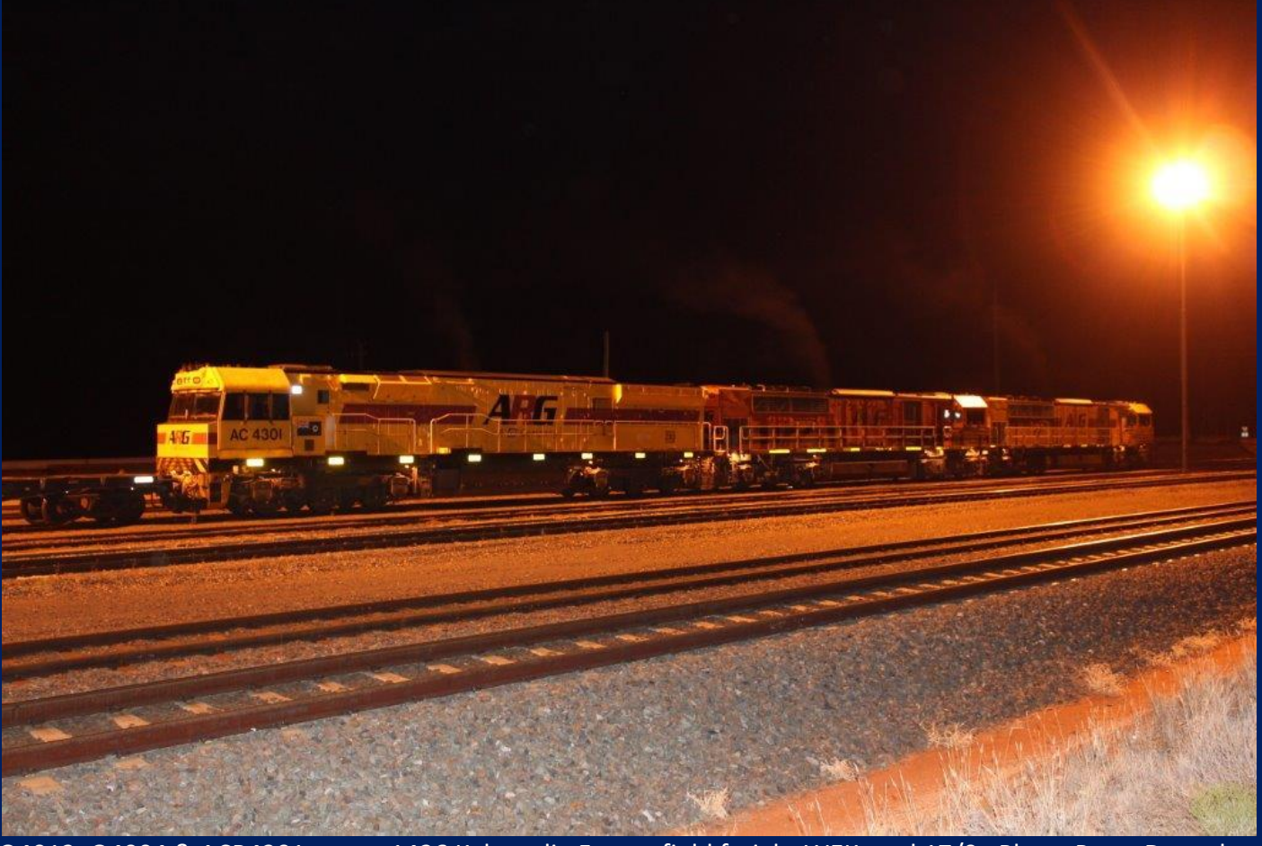
Q4012, Q4004 & ACB4301 to run 1426 Kalgoorlie Forrestfield freight WEK yard 17/9.