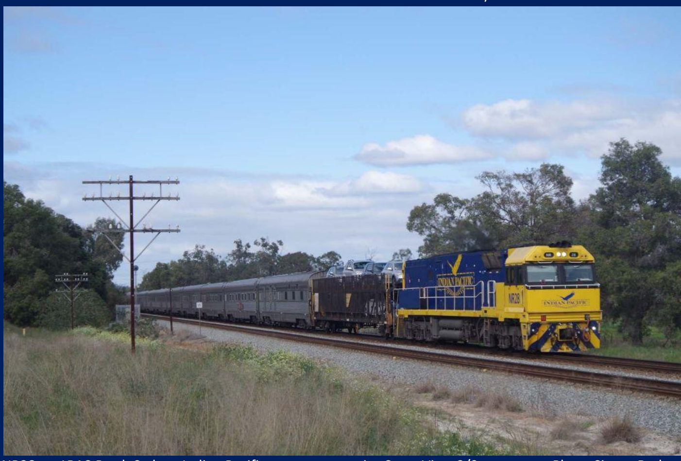
NR28 on 1PA8 Perth Sydney Indian Pacific passenger service Swan View 3/9.