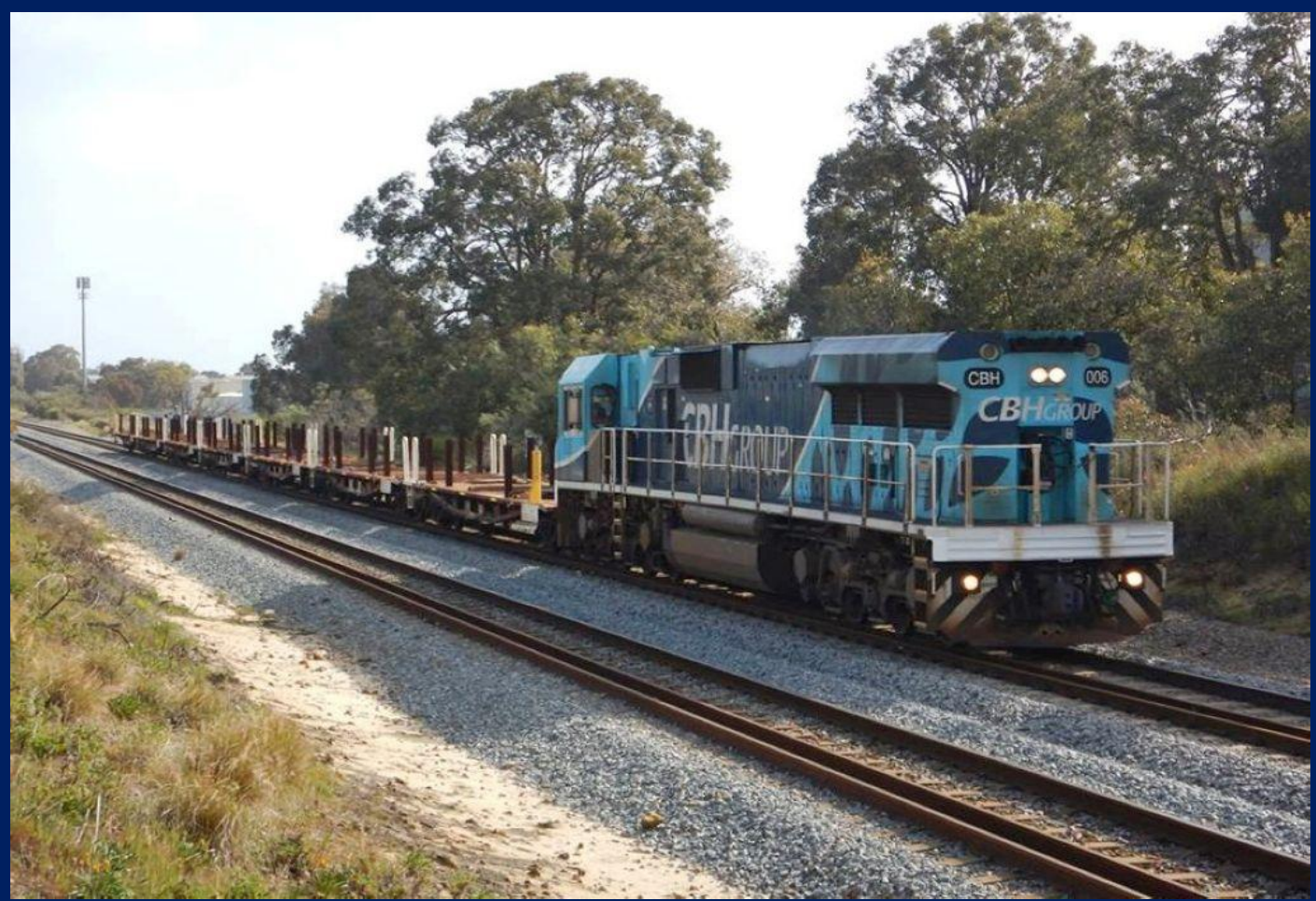
CBH006 on 5RT2 empty rail train returning from South West at Yangebup 21/9.