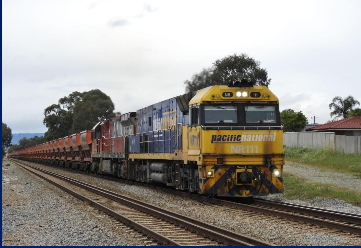
NR111 & MRL002 on 1030 Polaris ore Mt Walton to Kwinana at Thornlie September 24th.