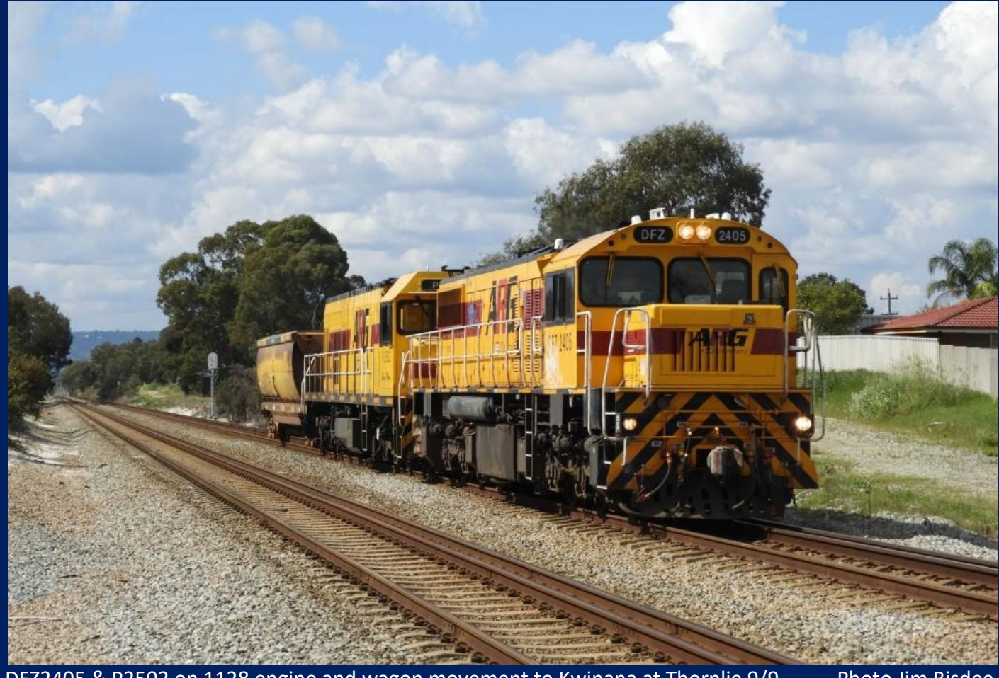
DFZ2405 & P2502 on 1128 engine and wagon movement to Kwinana at Thornlie 9/9.