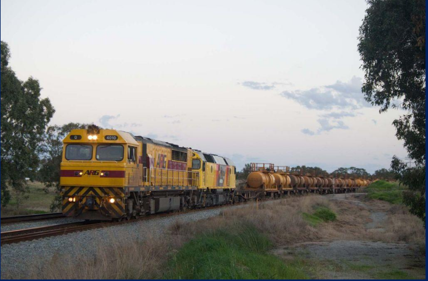
Q4010 & DC2205 on 7426 Kalgoorlie Forrestfield freight Middle Swan August 27th.