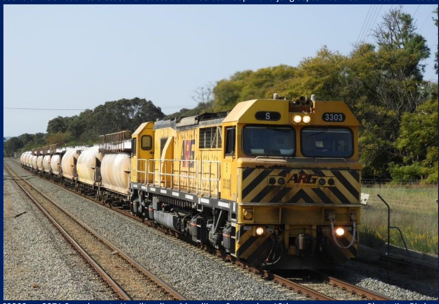
S3303 on 2271 Soundcem to Hamilton lime Mundijong September 18th.