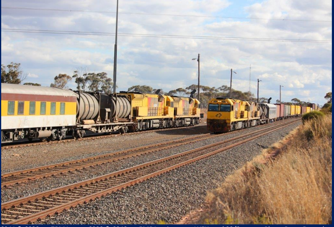
6041 & 6023 on 7PM1 cross 6022 & 6042 on 5MP1 as it enters WEK yard 23/9.