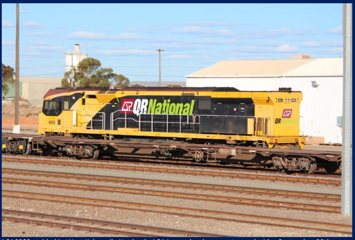
ACA6009 stabled in West Kalgoorlie Yard only ACA in number boxes not on cab sides September 29th.