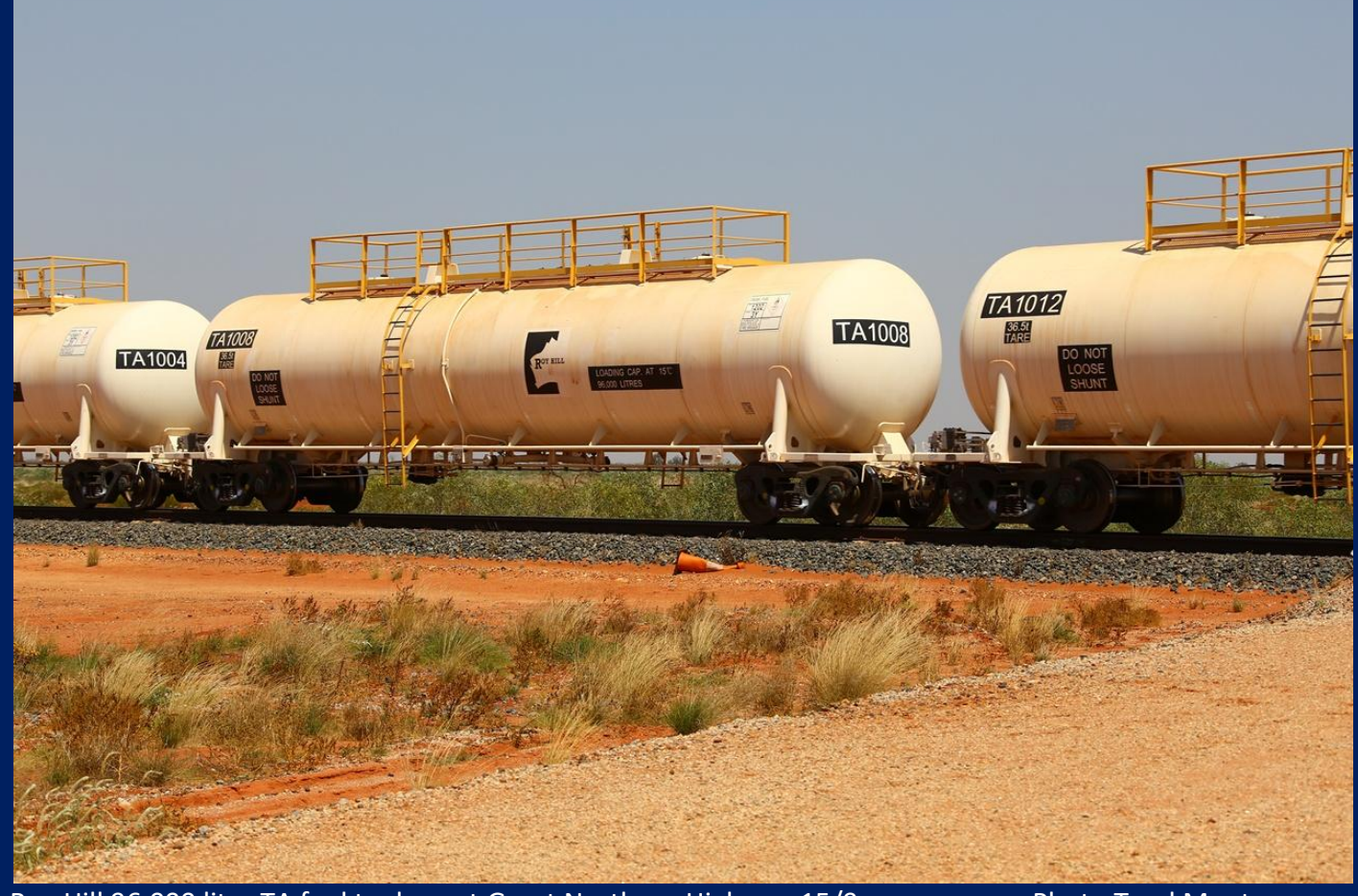
Roy Hill 96,000 litre TA fuel tankers at Great Northern Highway 15/9.