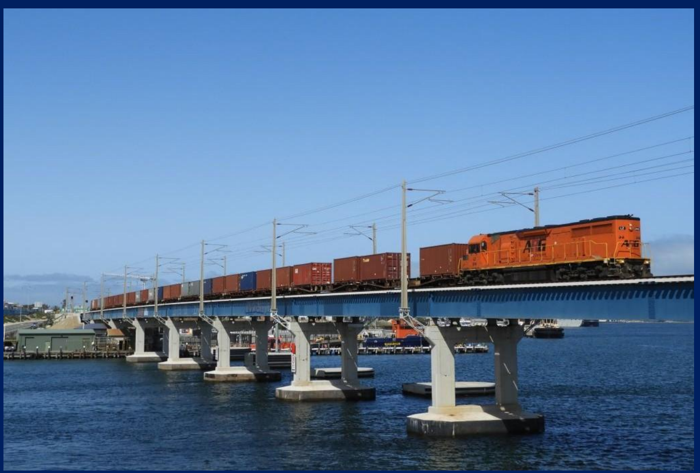
LZ3109 on 3196 rare earths container train crossing the Swan River at Fremantle 19/9.