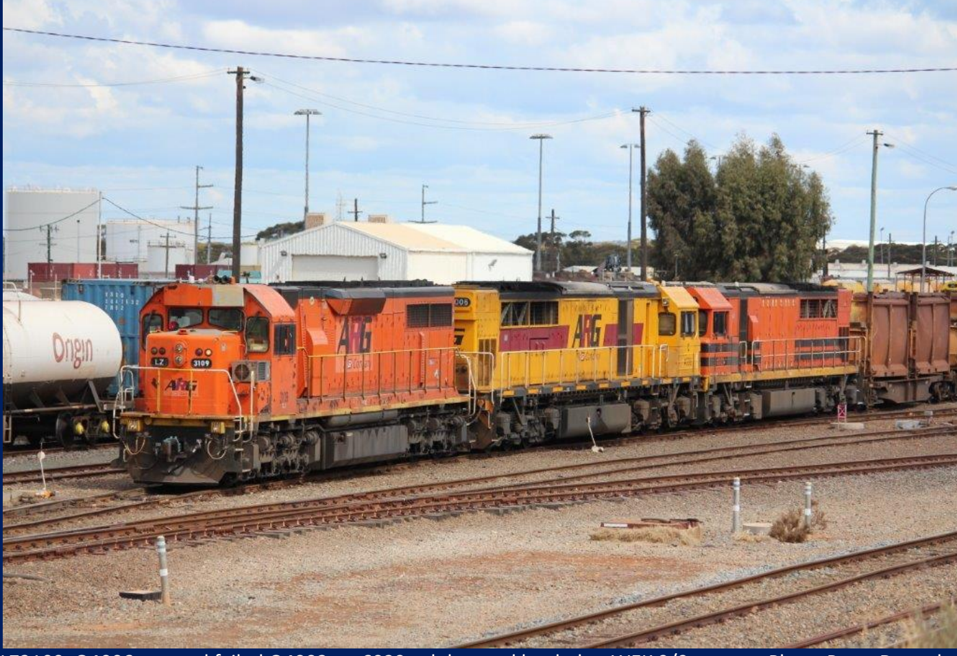
LZ3109, Q4006 rescued failed Q4003 on 6029 sulphur and hauled to WEK 9/9.