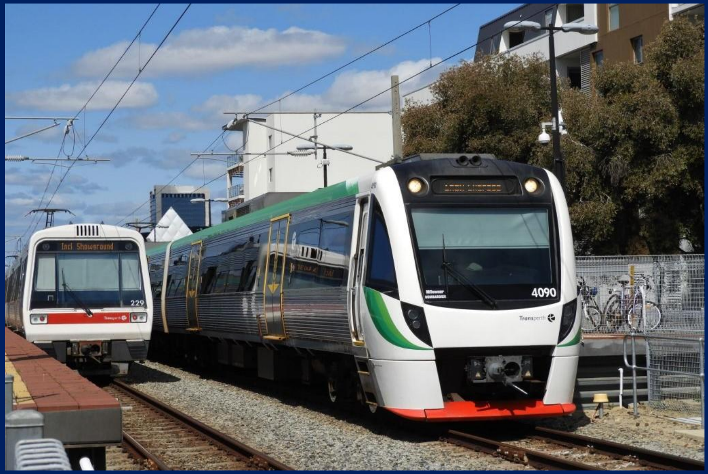
B series EMU on Royal Show special passing A series on regular service City West 30/9.