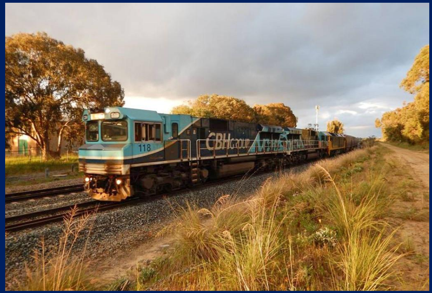
CBH118, CBH122 dead attached G511 on 4S56 Watco grain Yangebup 27/9.