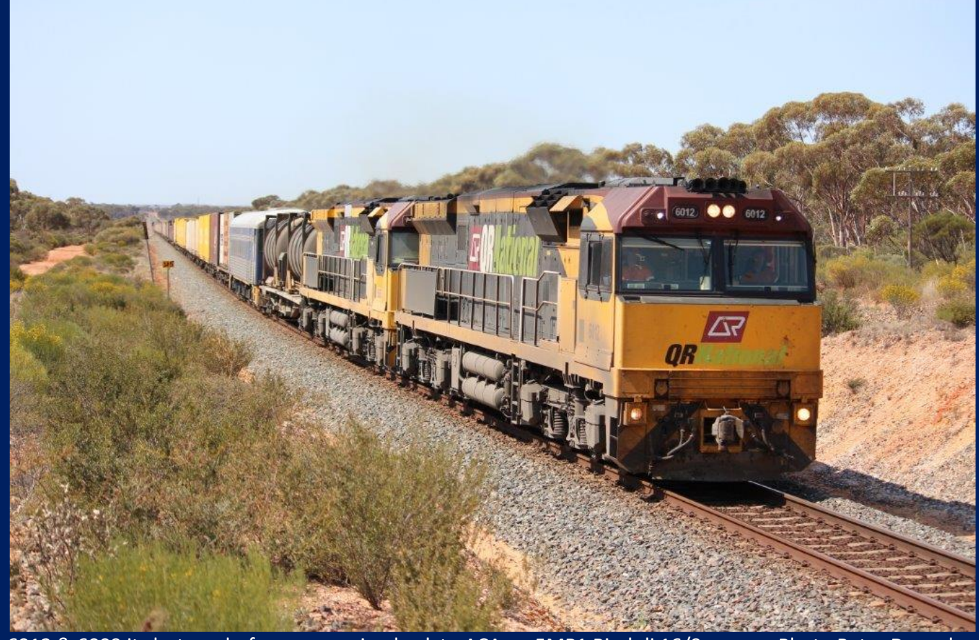
6012 & 6009 its last run before conversion back to ACA on 5MP1 Binduli 16/9.