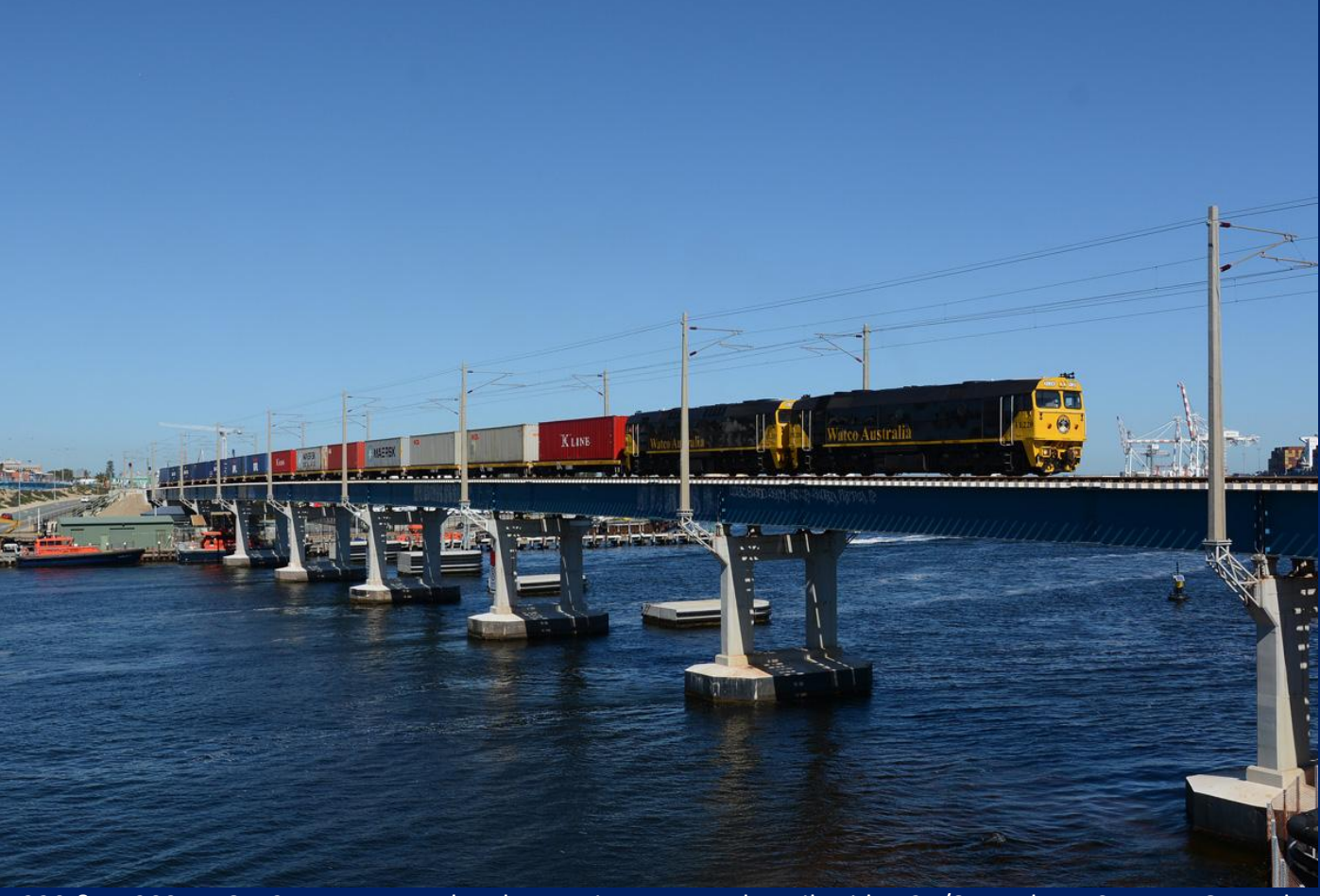
FL220 & HL203 on 6142 Watco port shuttle crossing Fremantle Rail Bridge 25/8.