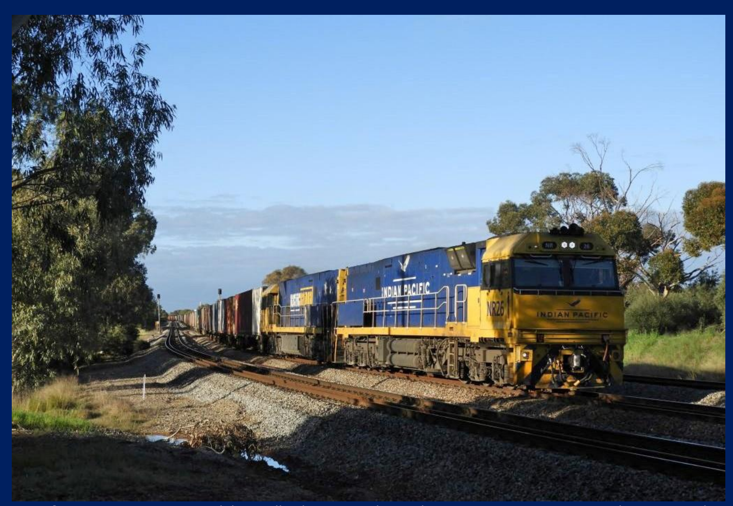
NR26 & NR49 on 1PS6 intermodal Woodbridge September 3rd.