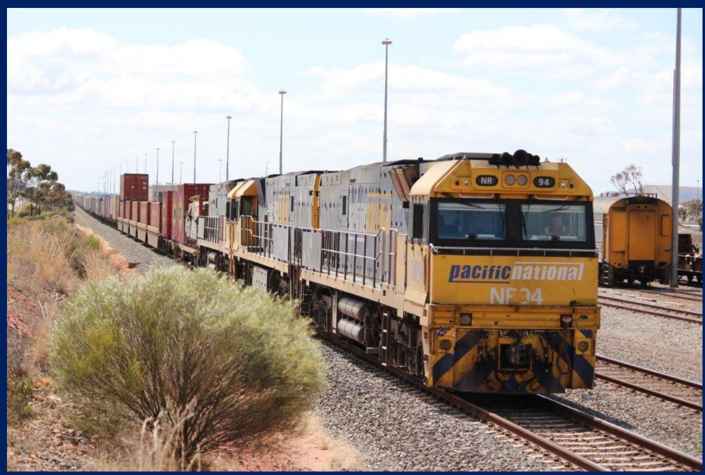
NR94, NR63 damaged NR48 after hit kangaroo on 5SP5 at WEK yard September 23rd.