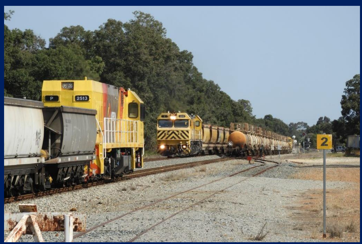
S3310 on 2962 bauxite crosses 237 caustic and 255 coal loop Mundijong September 18th.