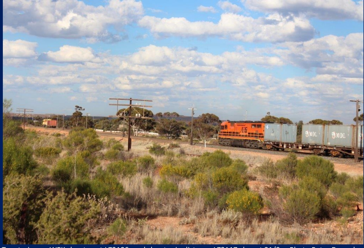
Two trains on WEK shunt next LZ3106 yard shunter in distance LZ3117 closest 21/9.