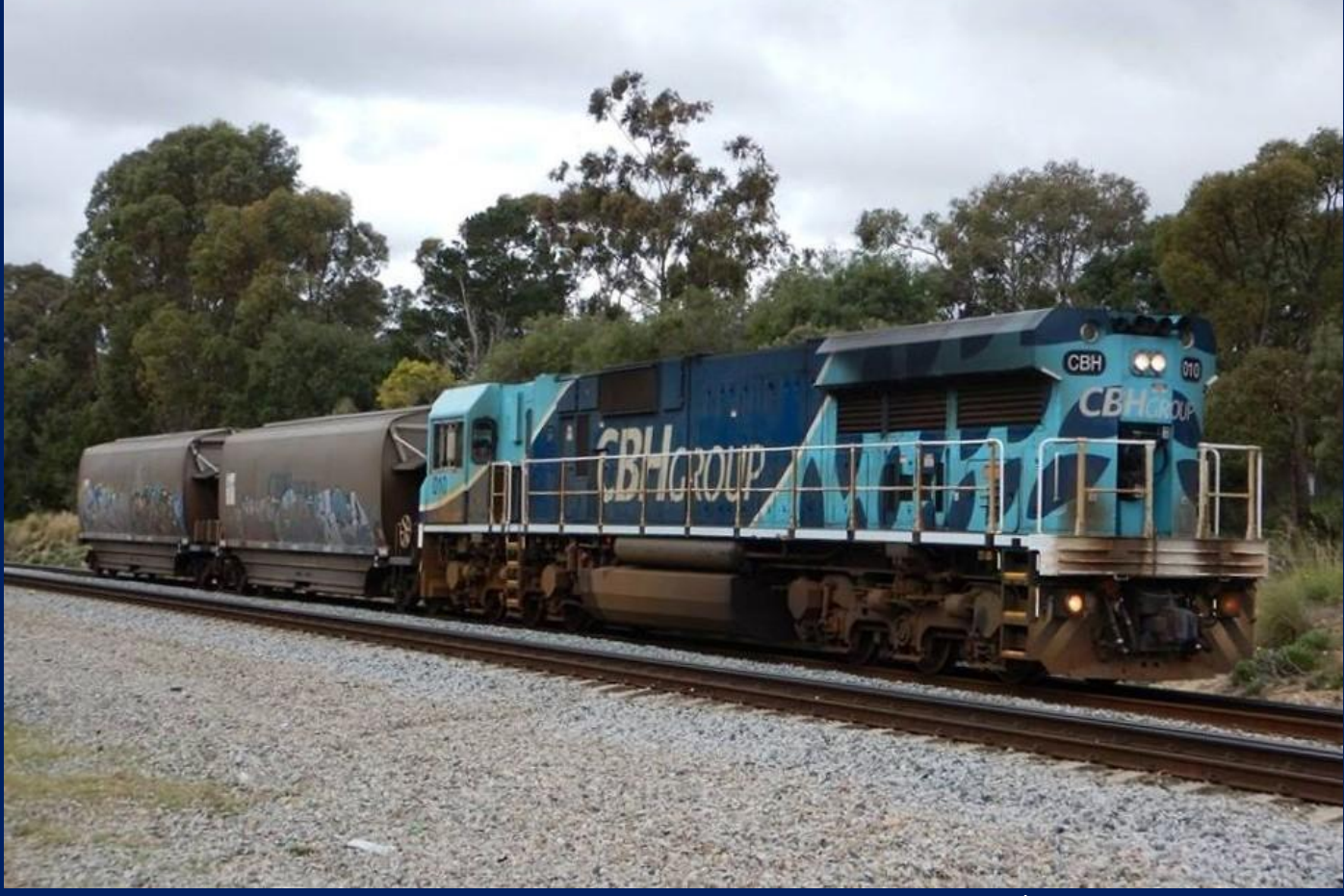
CBH010 + CBHN 2pack grain wagon on 2K02 loco wagon movement Yangebup 11/9.