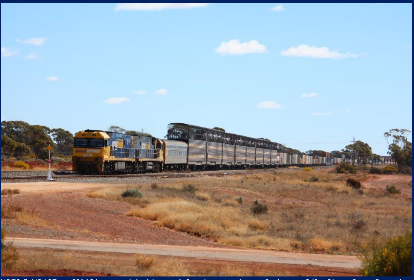
NR79 & NR107 on 6PM6 intermodal with rare 4x2pack car carriers at Parkeston 2/9.