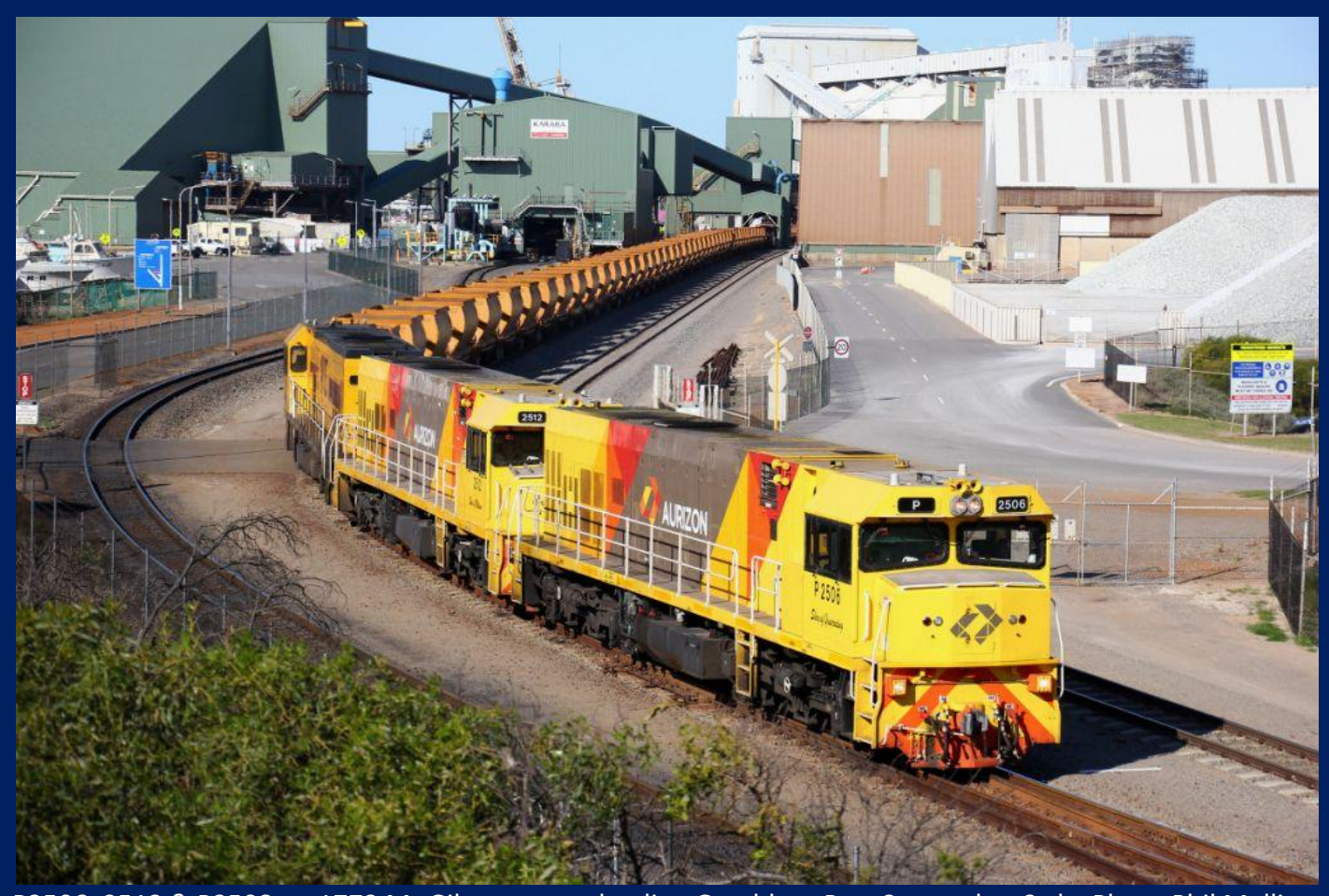
P2506, 2512 & P2508 on 1772 Mt Gibson ore unloading Geraldton Port September 3rd.