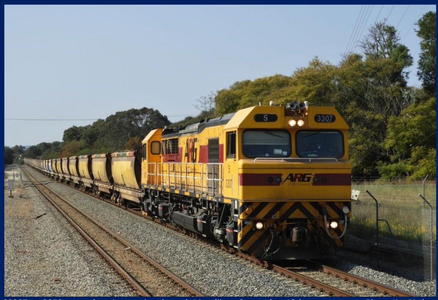
S3307 on 2953 empty bauxite running through Mundijong September 18th.