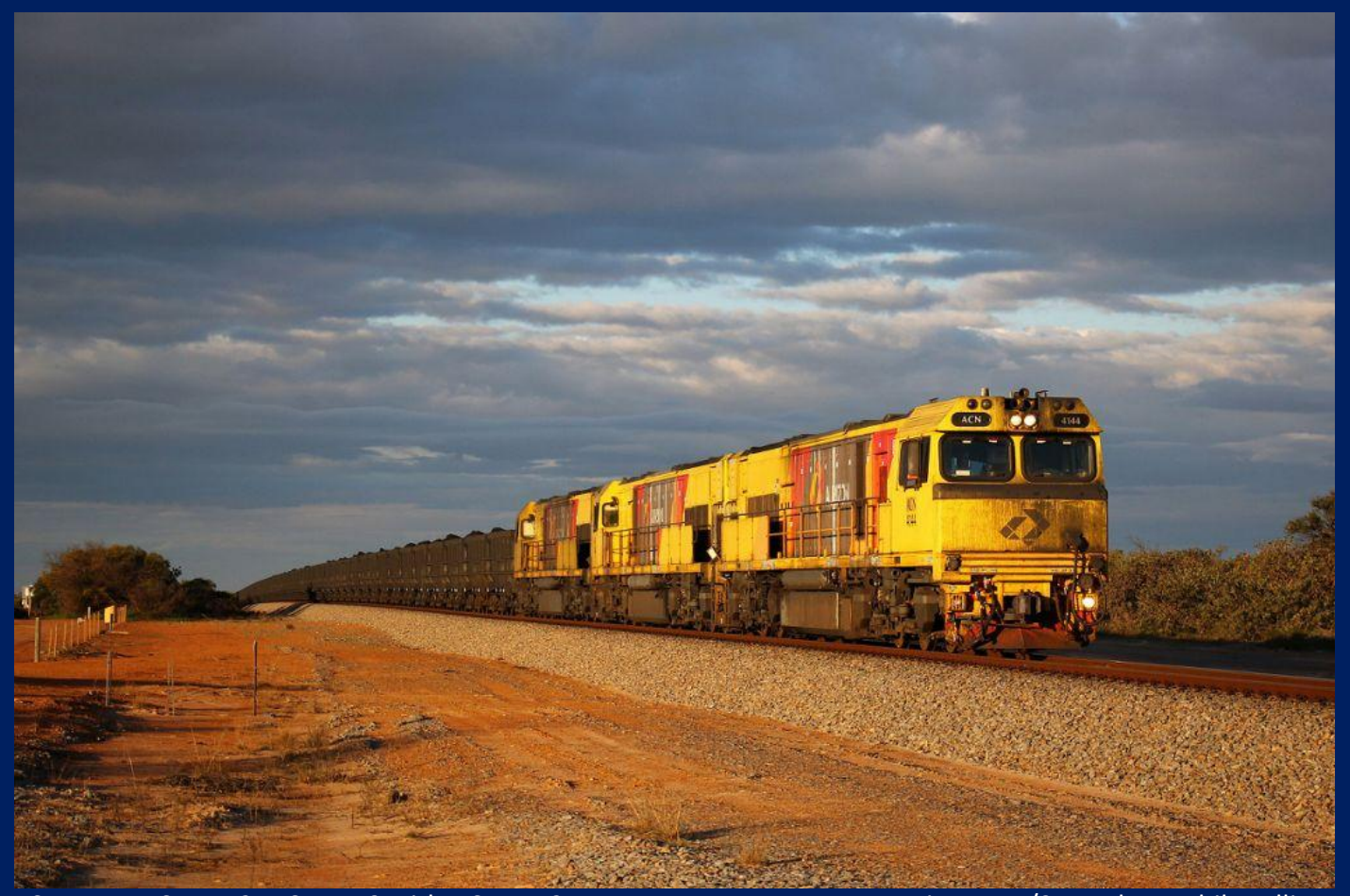
ACN4144, ACN4142, ACN4150 with ACN4152 DPU on rear Karara ore at Kojarena 7/9.