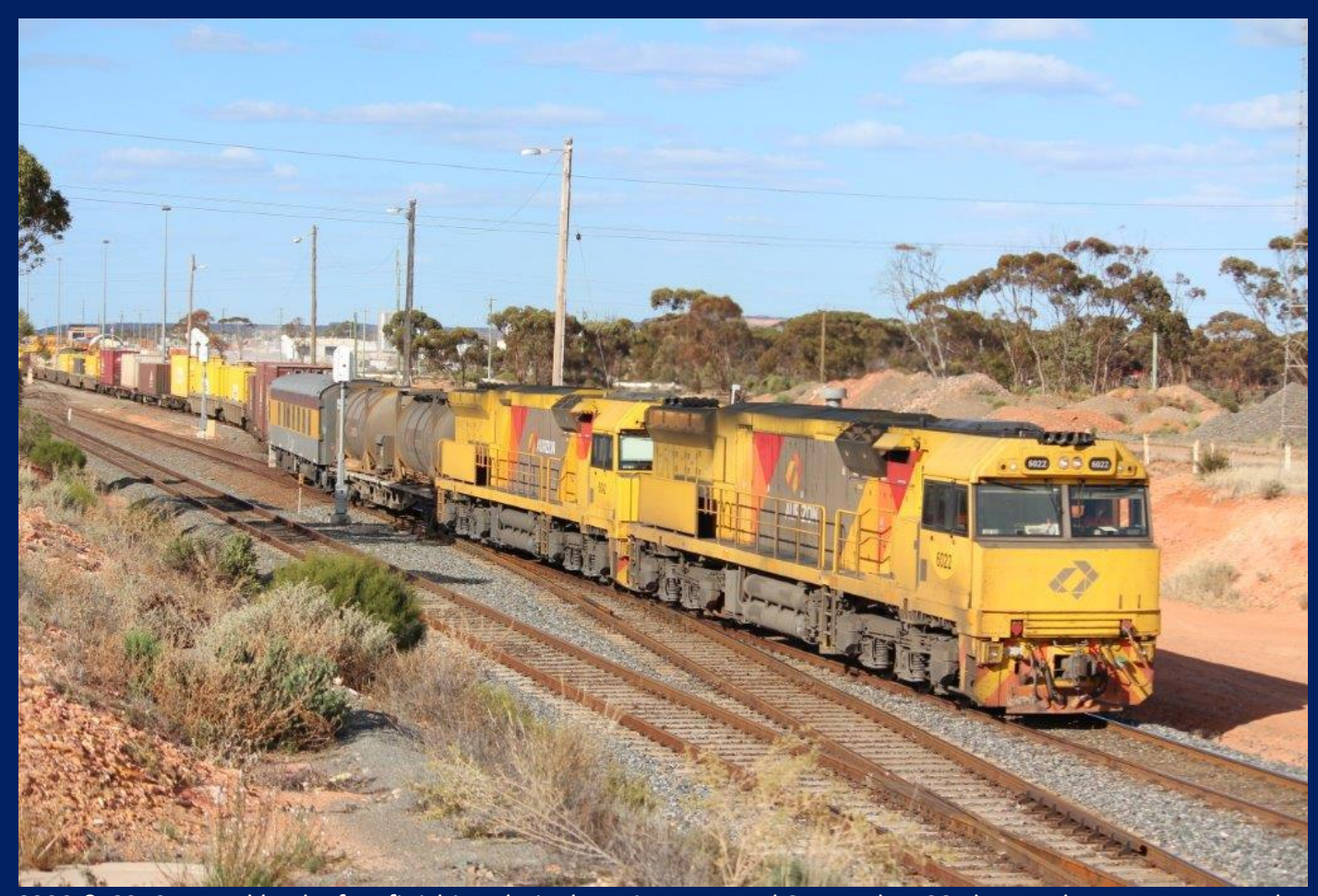
6022 & 6042 propel back after finishing their shunt in WEK yard September 23rd.