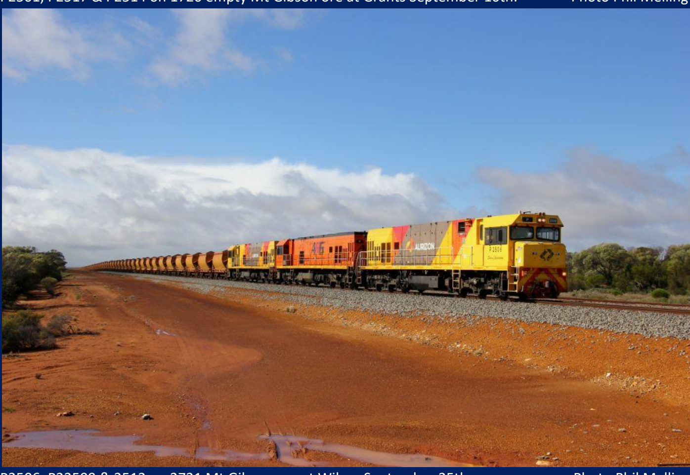
P2506, P23509 & 2512 on 2721 Mt Gibson ore at Wilroy September 25th.