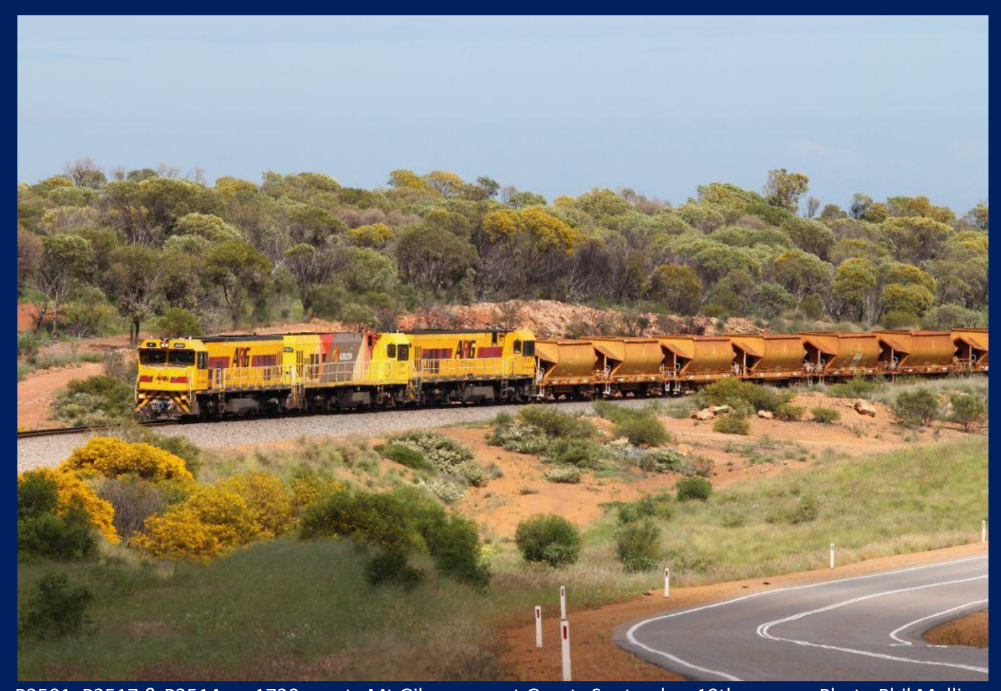
P2501, P2517 & P2514 on 1720 empty Mt Gibson ore at Grants September 10th.