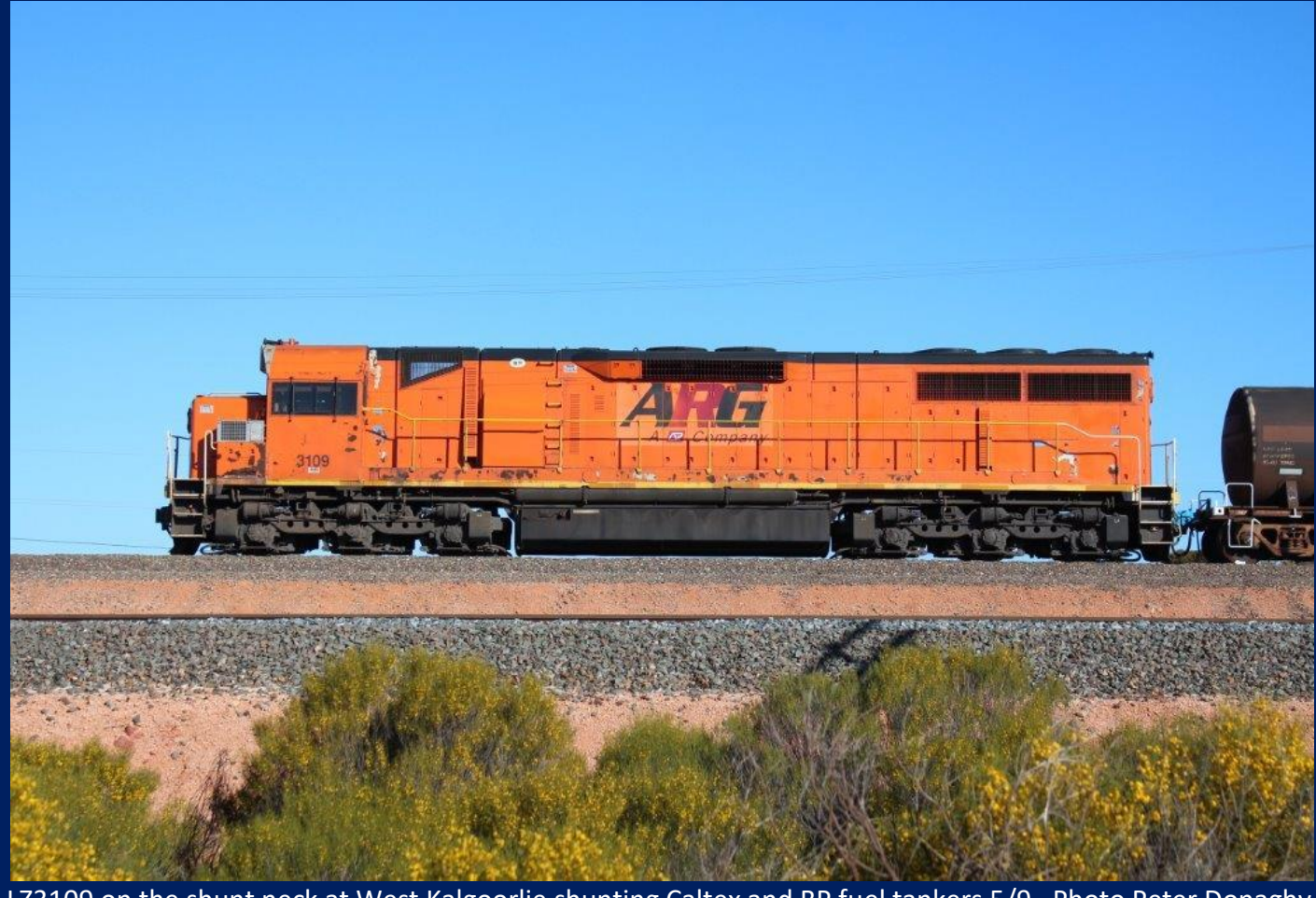
LZ3109 on the shunt neck at West Kalgoorlie shunting Caltex and BP fuel tankers 5/9.