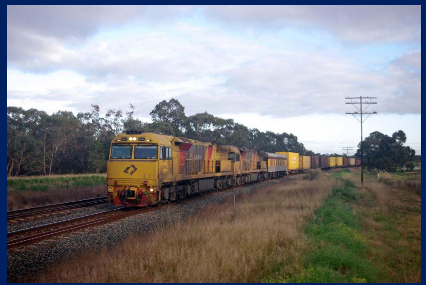
6042 & 6024 on 5MP1 Melbourne Perth Aurizon intermodal Middle Swan 20/8.