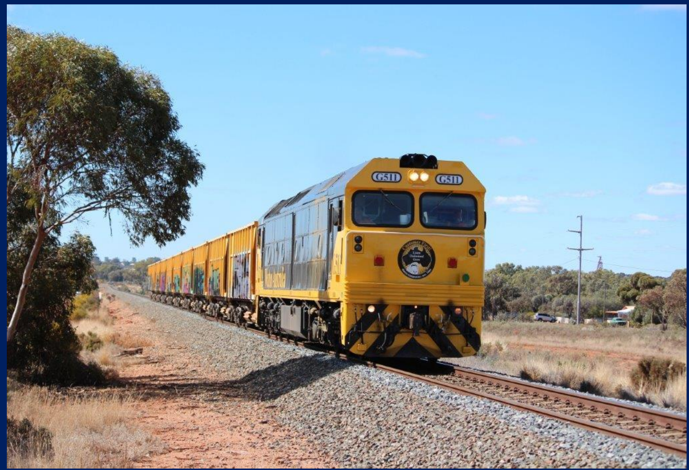
G511 on 7BT4 empty ballast train Leonora to Hampton at Somerville 2/9.