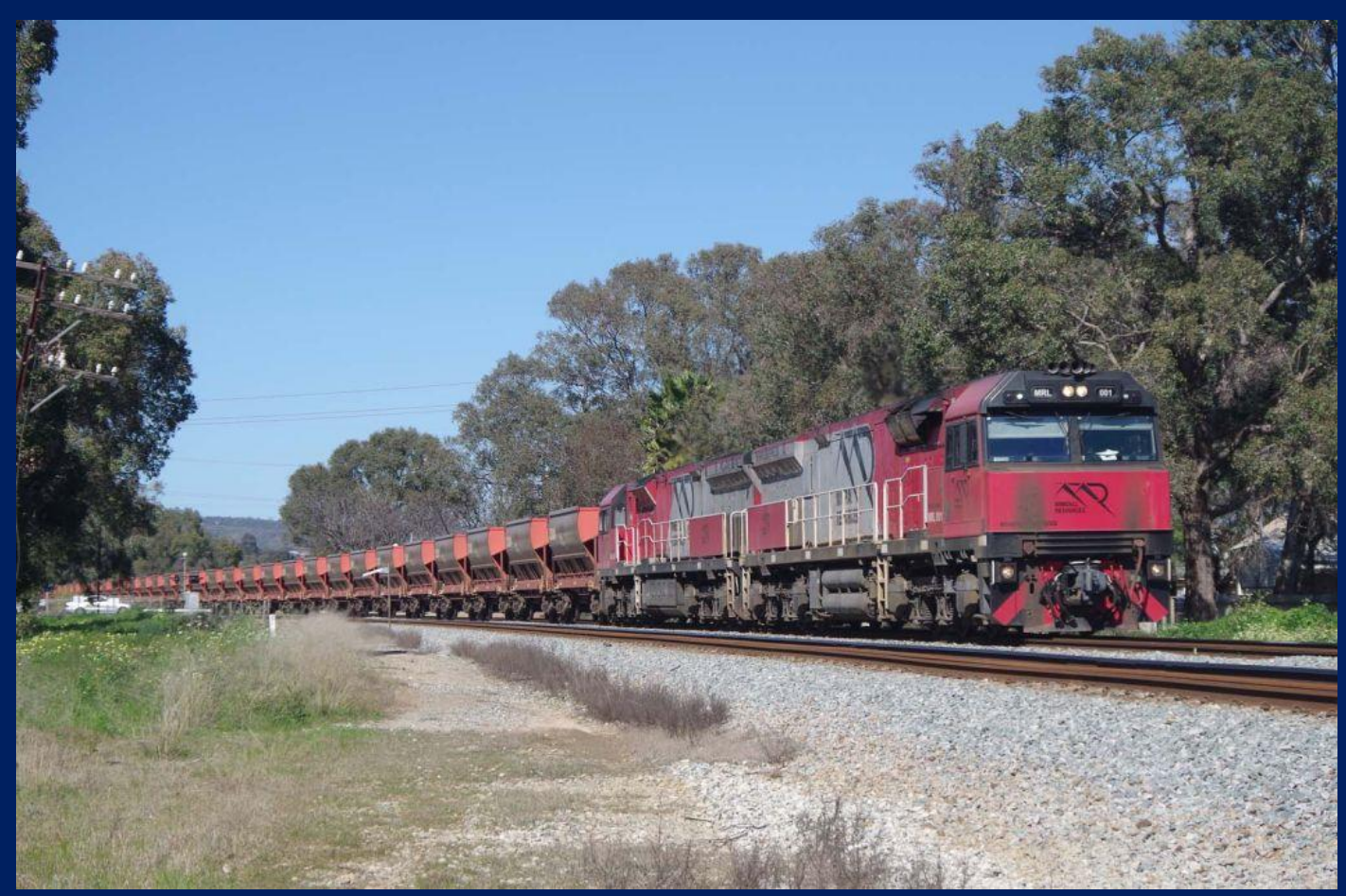
MRL001 & MRL004 on 4035 empty Polaris ore Swan View August 24th.