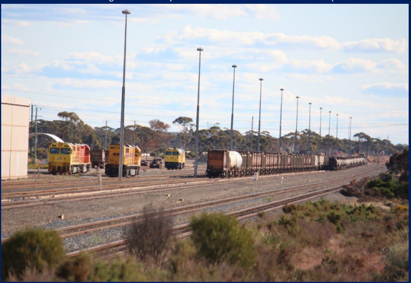
WEK yard fuel sulphur trains stabled Q4007, LZ3114, Q4016 and DC2205 29/9.