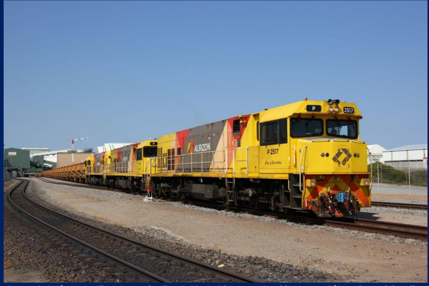
P2517, P2505 & P2504 all Aurizon unloading 2722 Mt Gibson ore Geraldton Port 18/9.