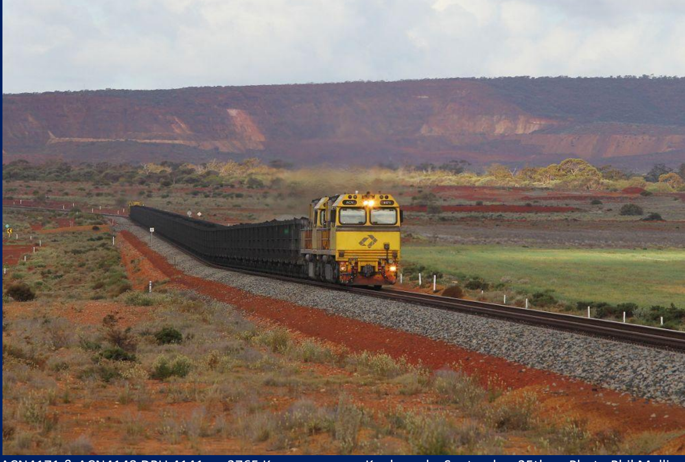
ACN4171 & ACN4148 DPU 4141 on 2765 Karara ore near Koolanooka September 25th.