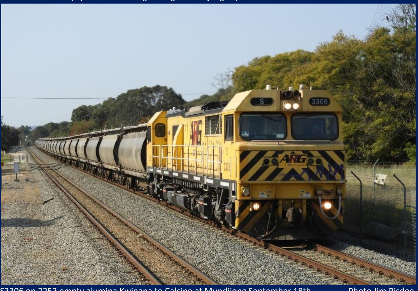
S3306 on 2253 empty alumina Kwinana to Calcine at Mundijong September 18th.