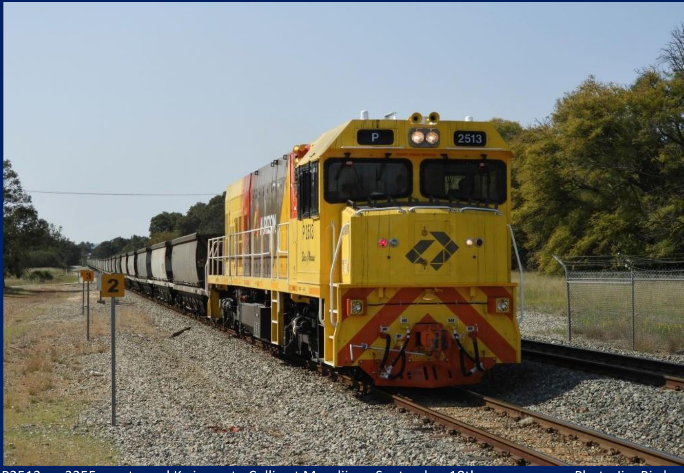
P2513 on 2255 empty coal Kwinana to Collie at Mundijong September 18th.