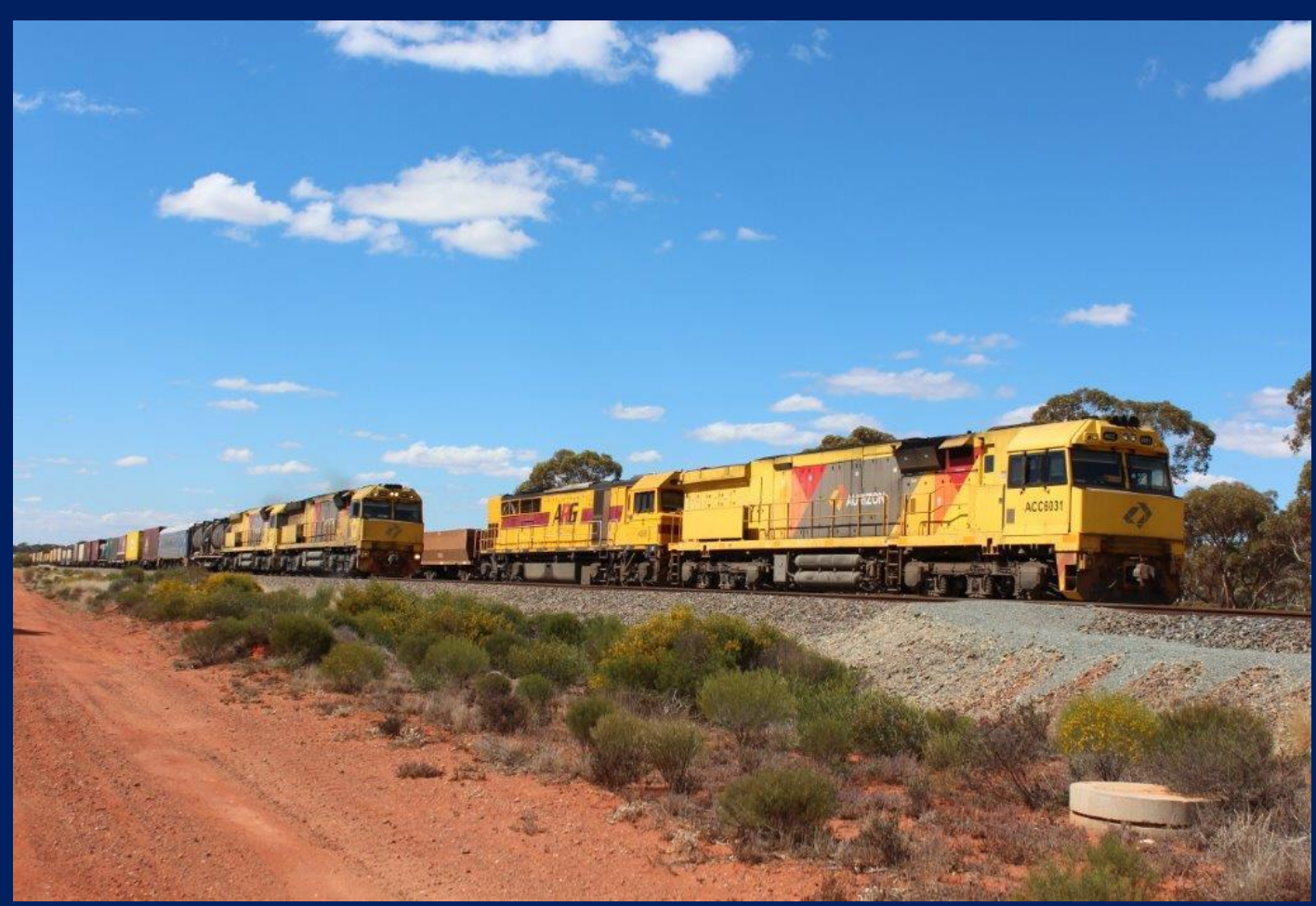
ACC6031 & Q4018 on 1414 empty ore bypassed 6026 & 6025 on 6MP1 Binduli 10/9.