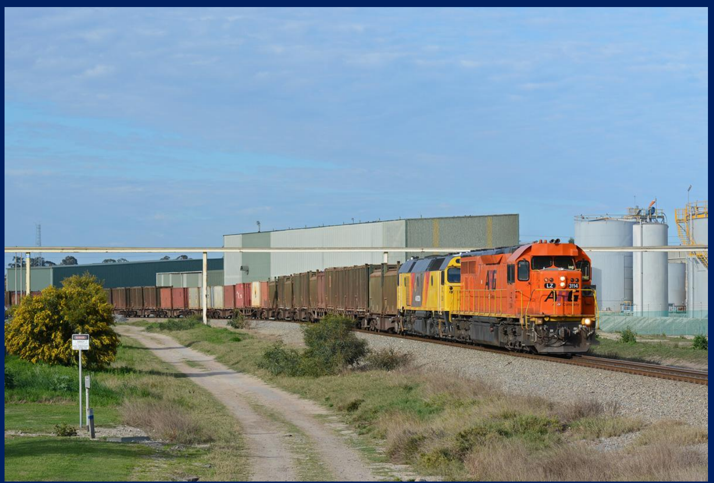
LZ3114 & DC2205 on 1430 empty sulphur Kwinana August 28th.