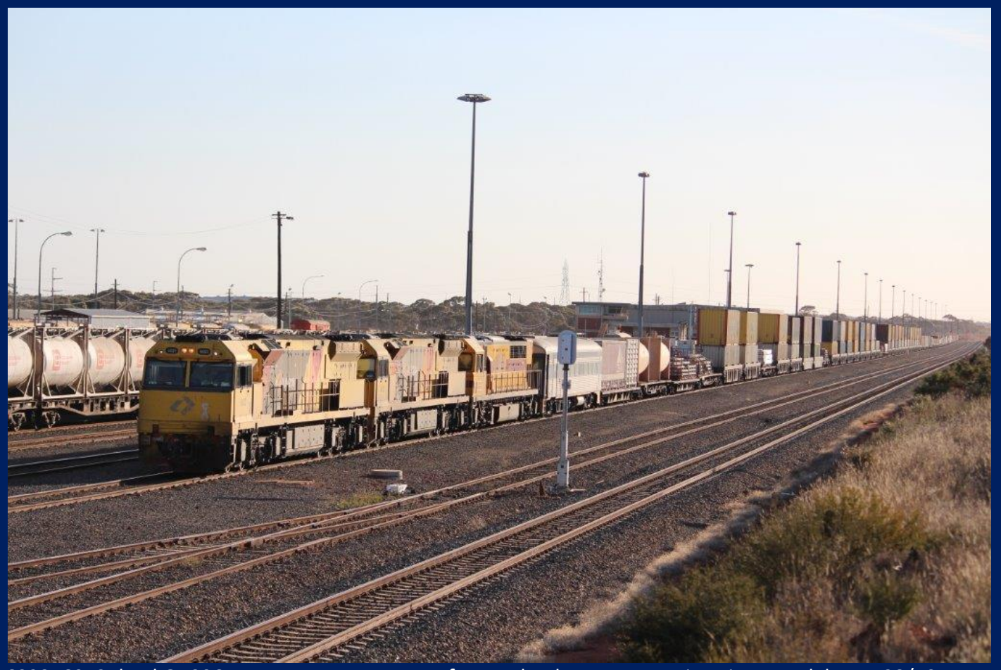
6023, 6042 dead Q4006 on way to Port Augusta for overhaul on 7PM1 Aurizon intermodal WEK 28/10.