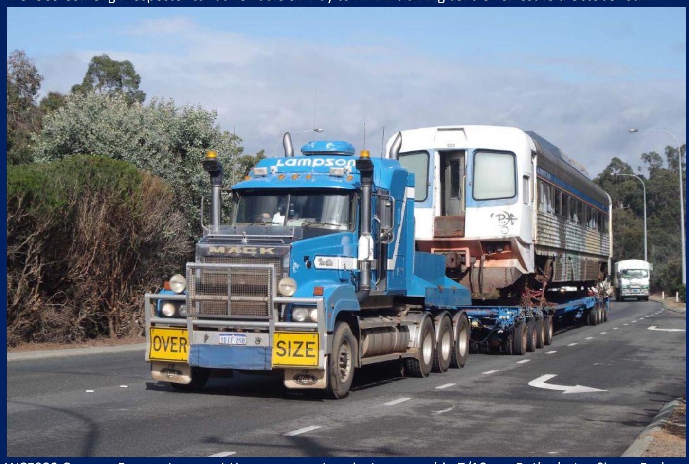
WCE922 Comeng Prospector car at Hovea on way to private ownership 7/10.