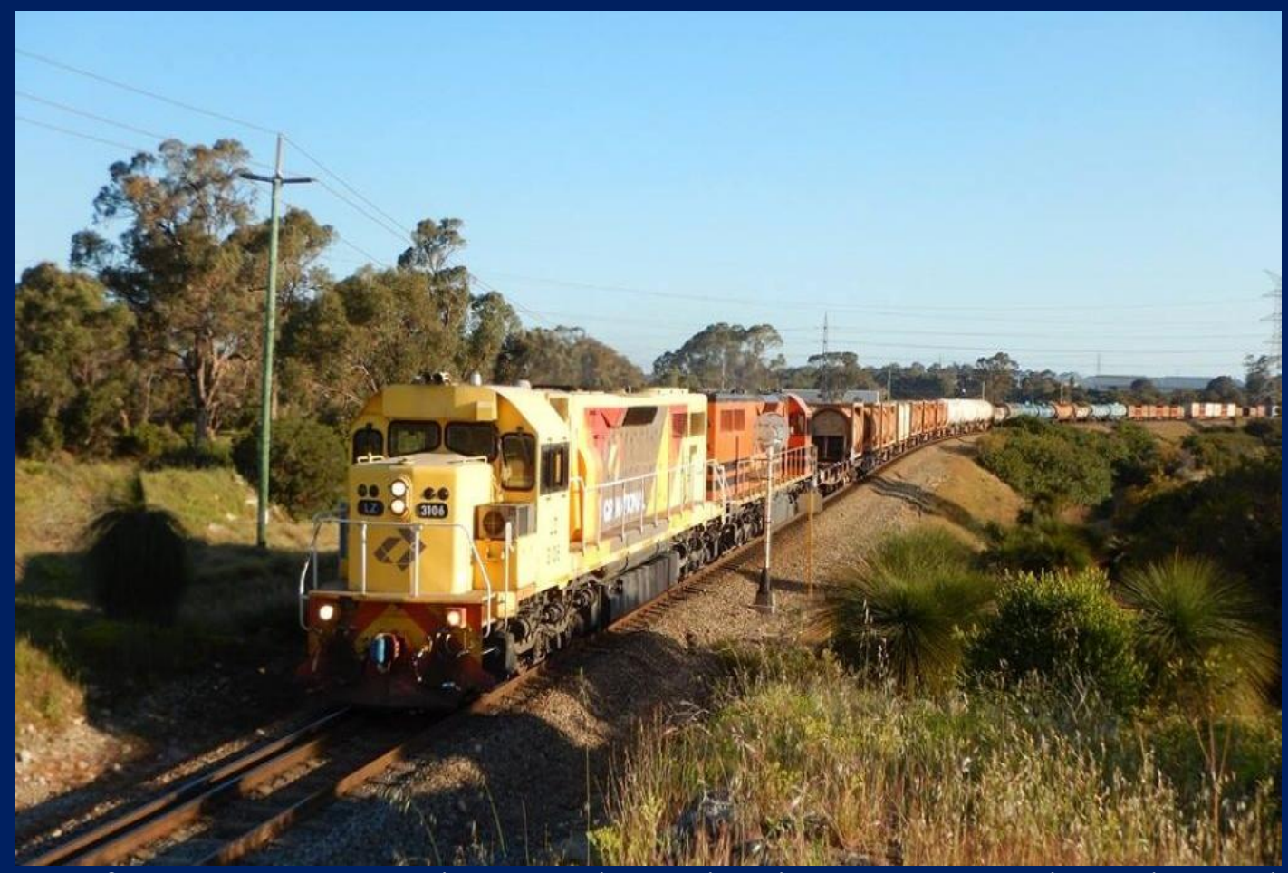
LZ3106 & LZ3111 on 2025 Kwinana shunter Yangebup October 9th.