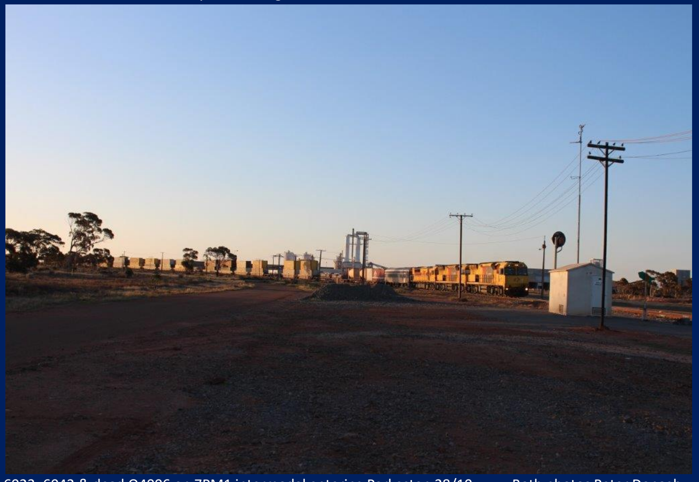
6023, 6042 & dead Q4006 on 7PM1 intermodal entering Parkeston 28/10.