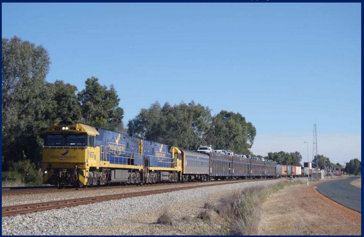
NR27 & NR25 both Indian Pacific livery on 5PM5 intermodal Millendon Junction 5/10.

Publisher: Jim Bisdee Email: pm1225@bigpond.com Copyright Jim Bisdee © 2017