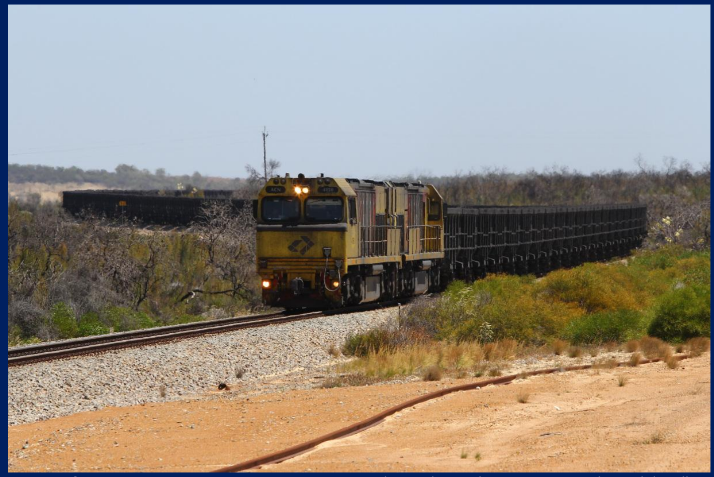
ACN4150 & ACN4171 on 1762 empty Karara ore near Eradu October 29th.