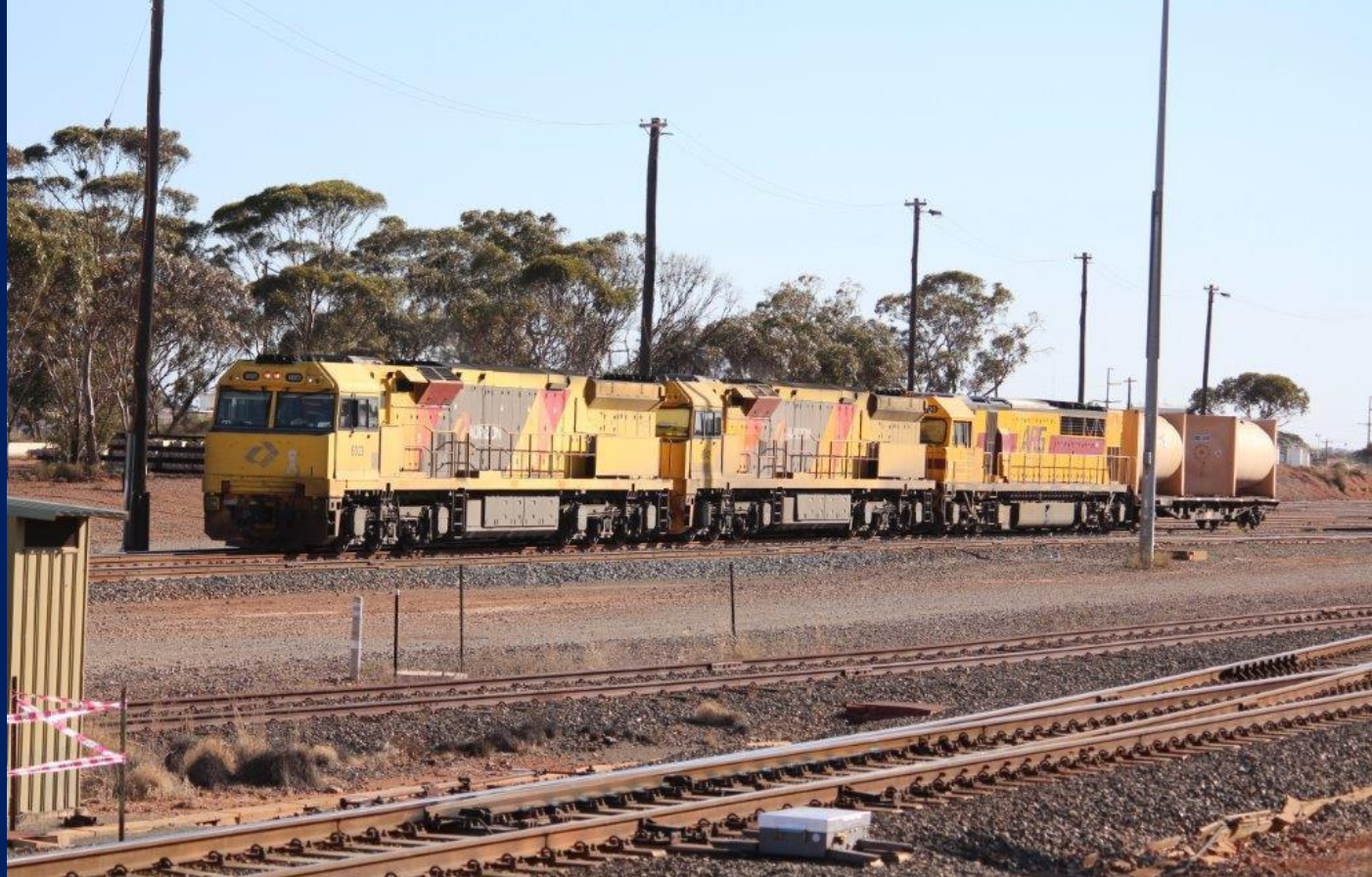
6023 & 6042 have attached Q4006 and wagon for 7PM1 at WEK yard 28/10.