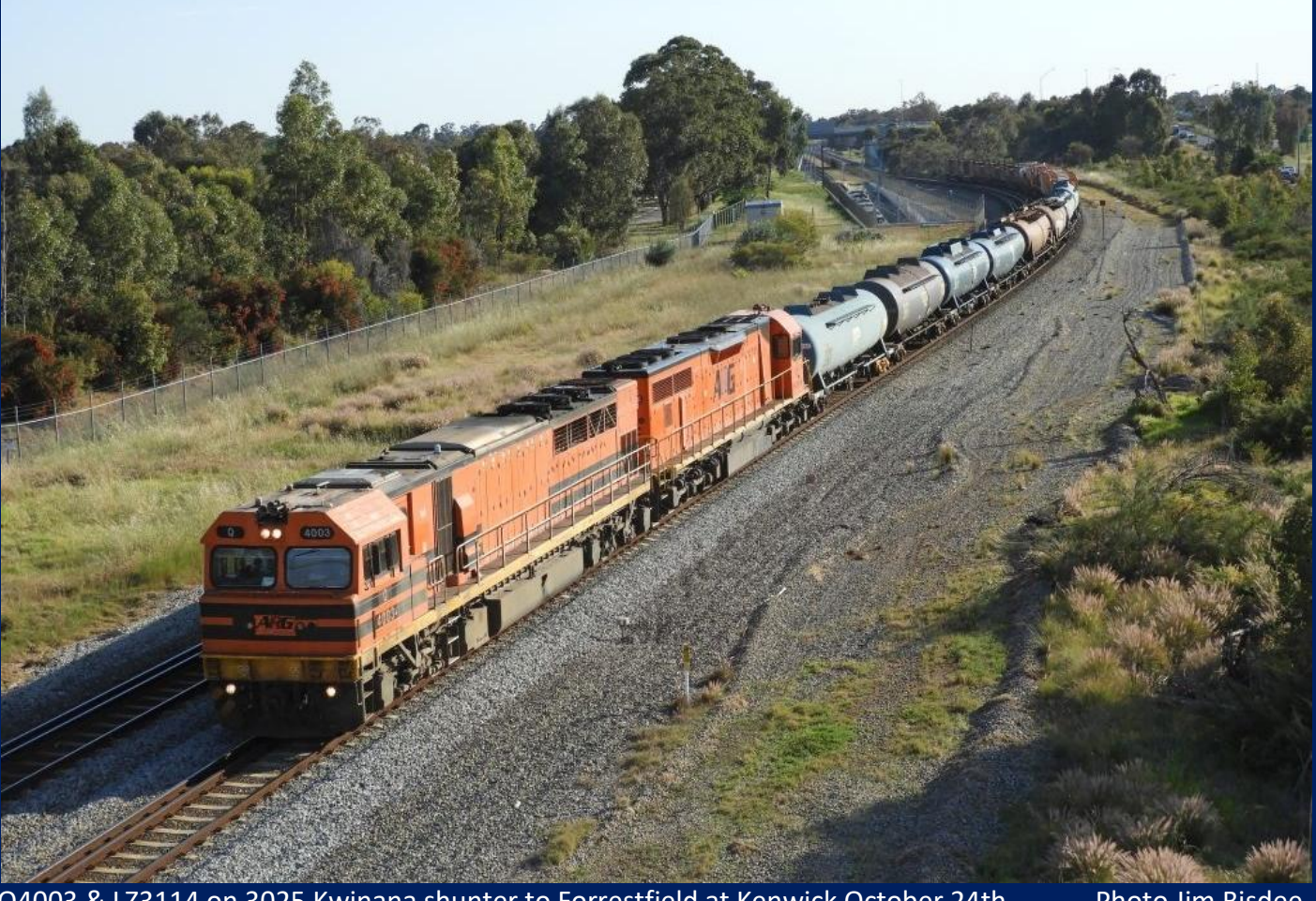
Q4003 & LZ3114 on 3025 Kwinana shunter to Forrestfield at Kenwick October 24th.