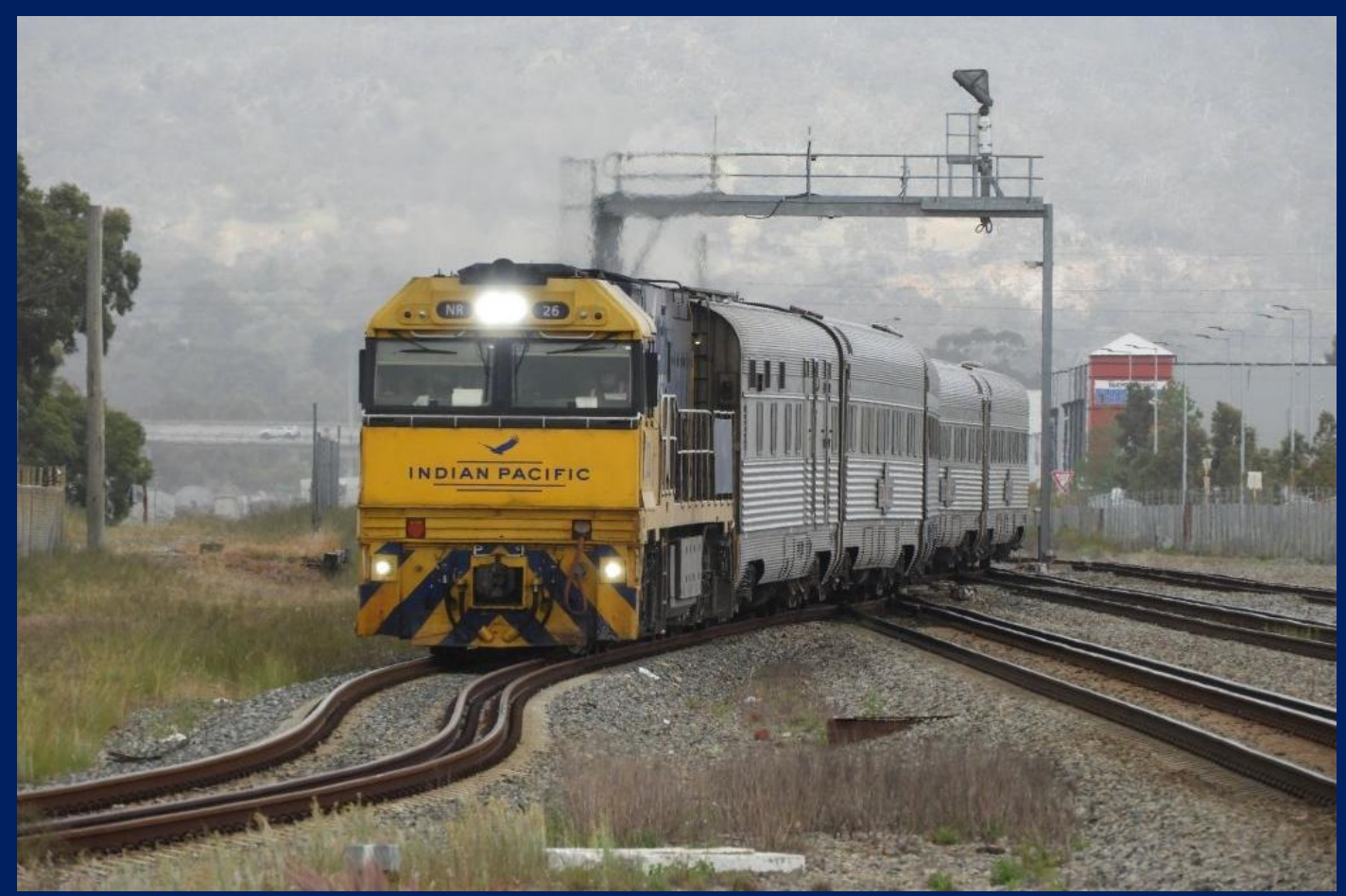
NR26 on 5AP8 crossing over from arc to PTA tracks Midland October 28th.