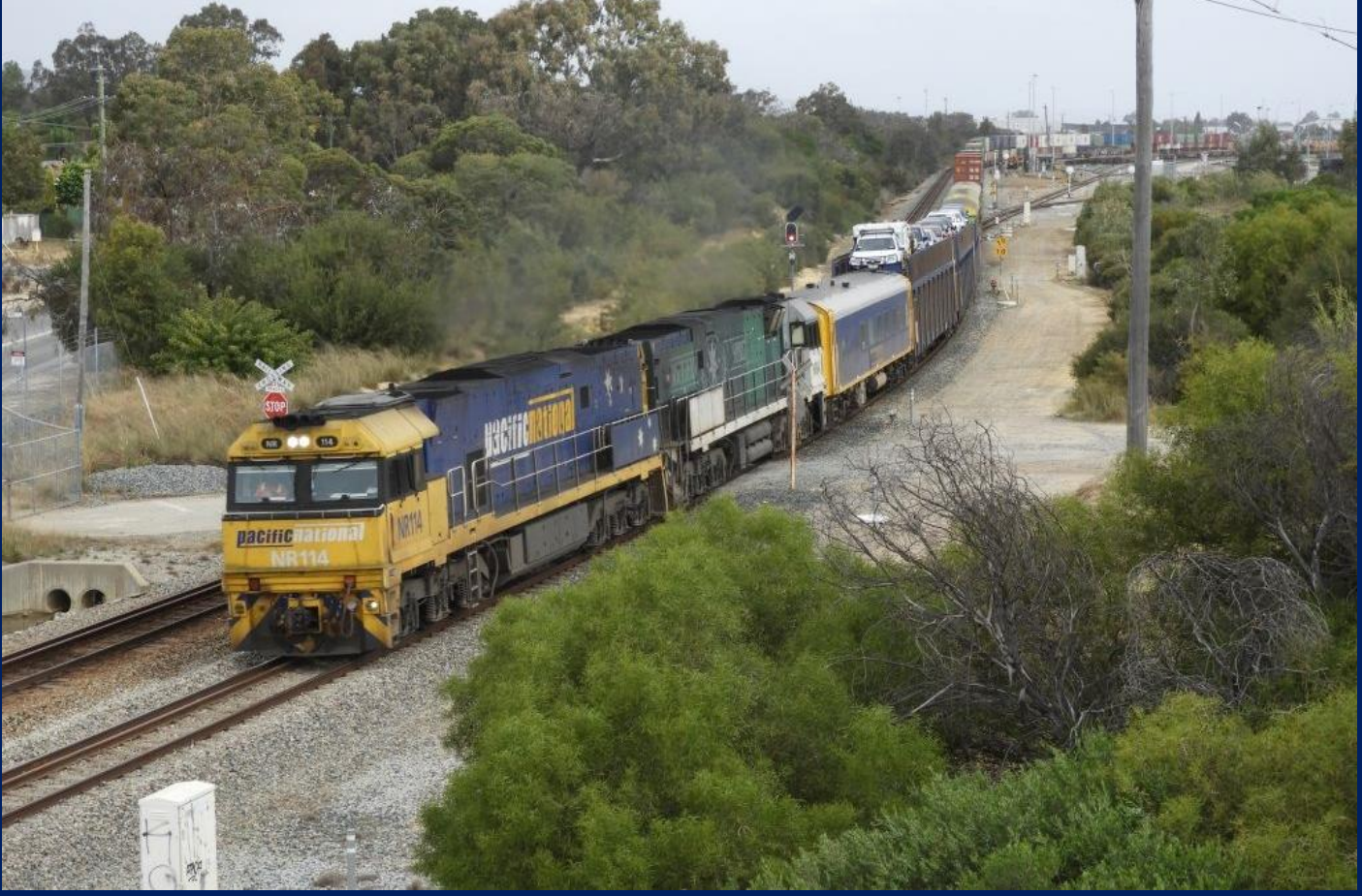
NR114 & NR84 on 7PM5 intermodal departing Forrestfield October 28th.