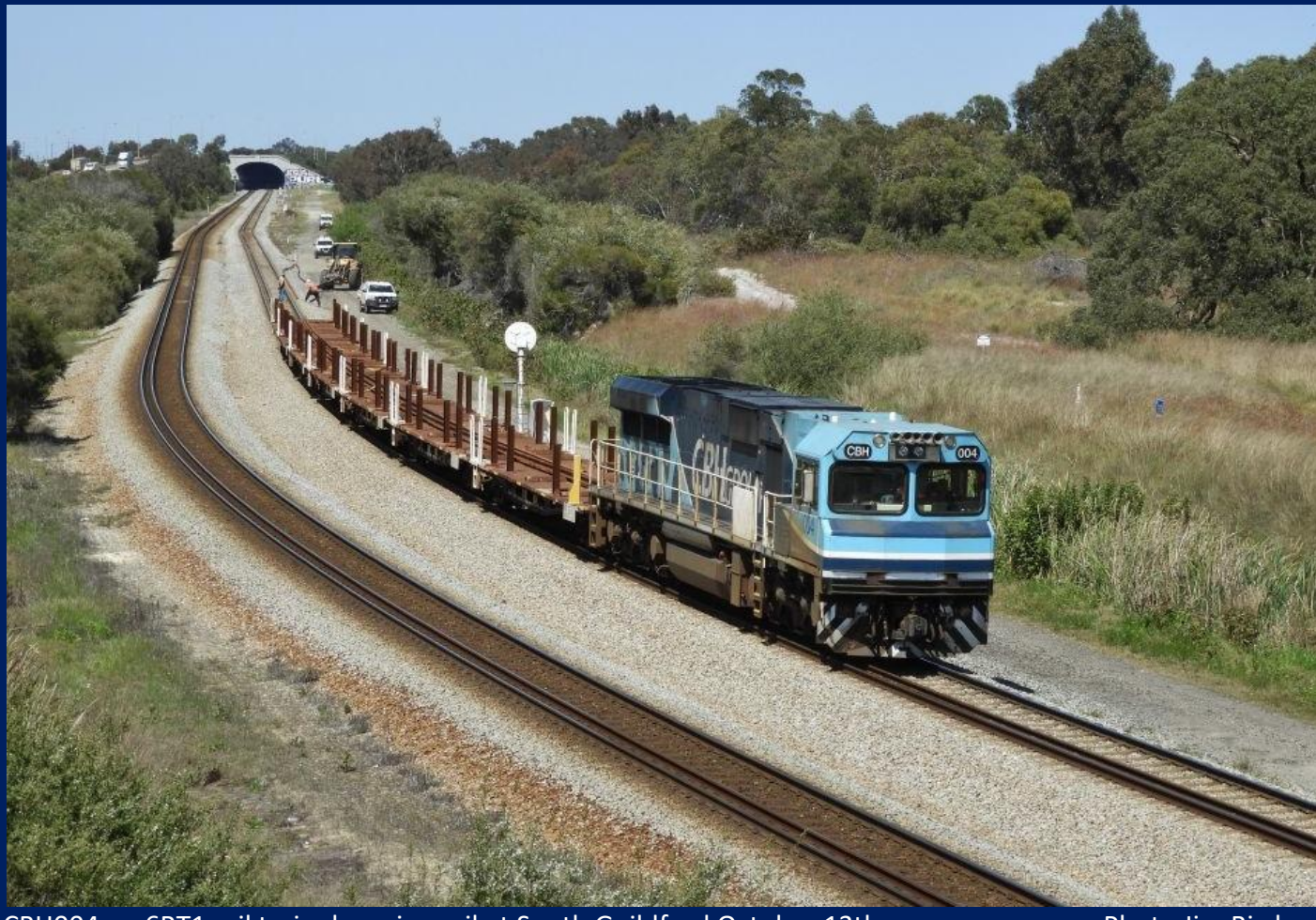
CBH004 on 6RT1 rail train dropping rail at South Guildford October 13th.