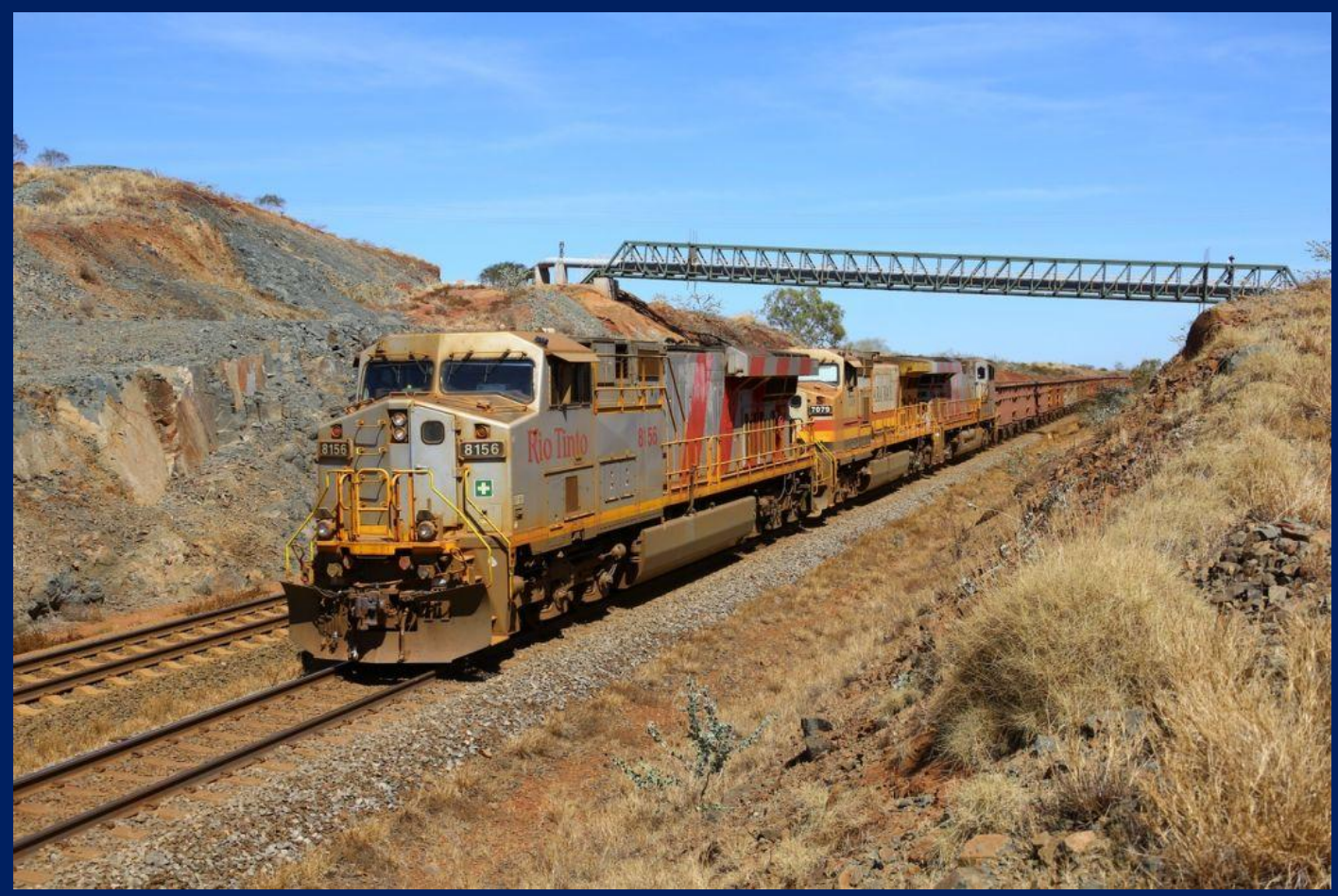
8156, 7079 & 8121 on empty ore at 37.5km on Cape Lambert line passing under water supply main 18/10.