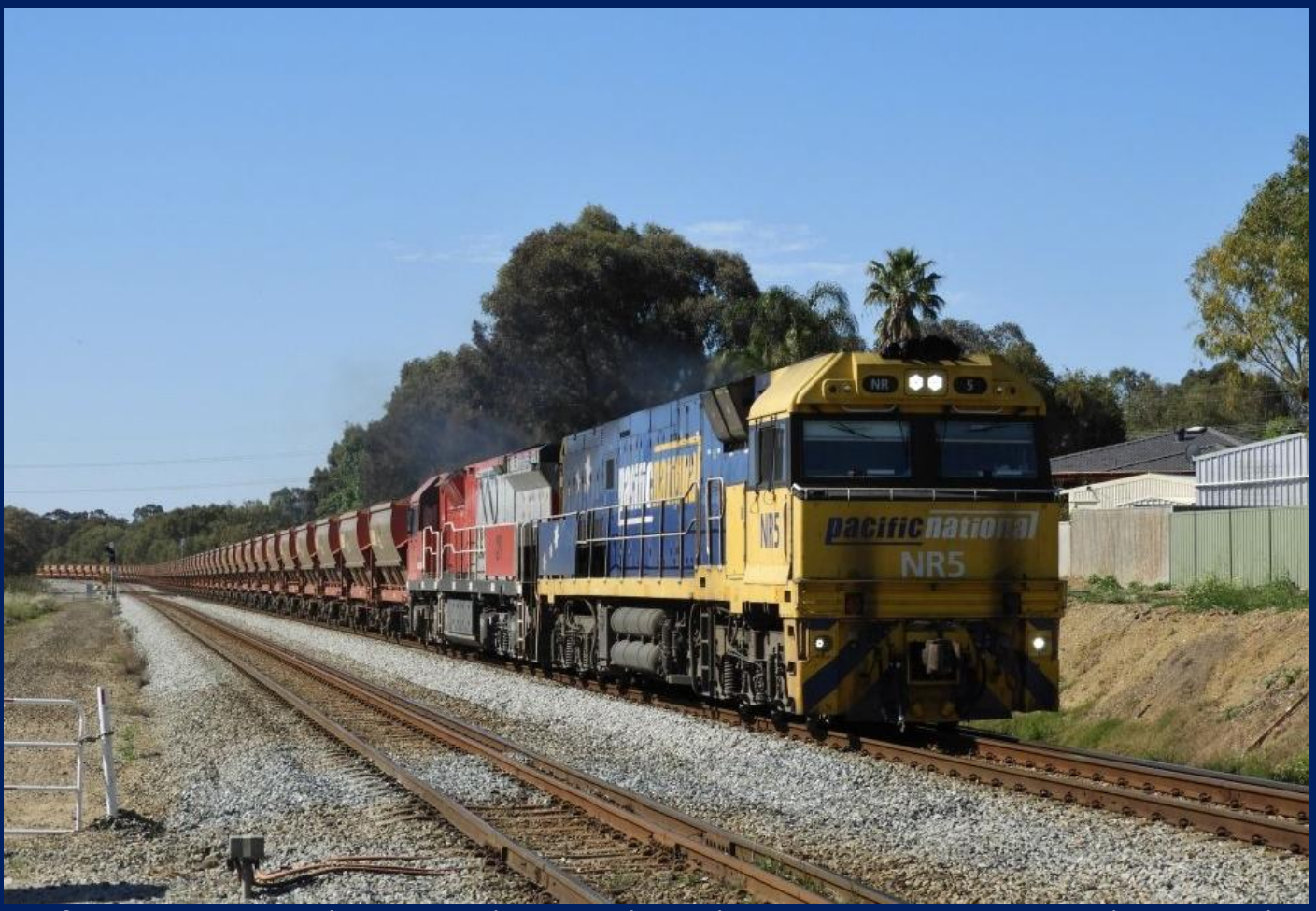
NR5 & MRL003 on 6030 Polaris ore Hazelmere October 20th.