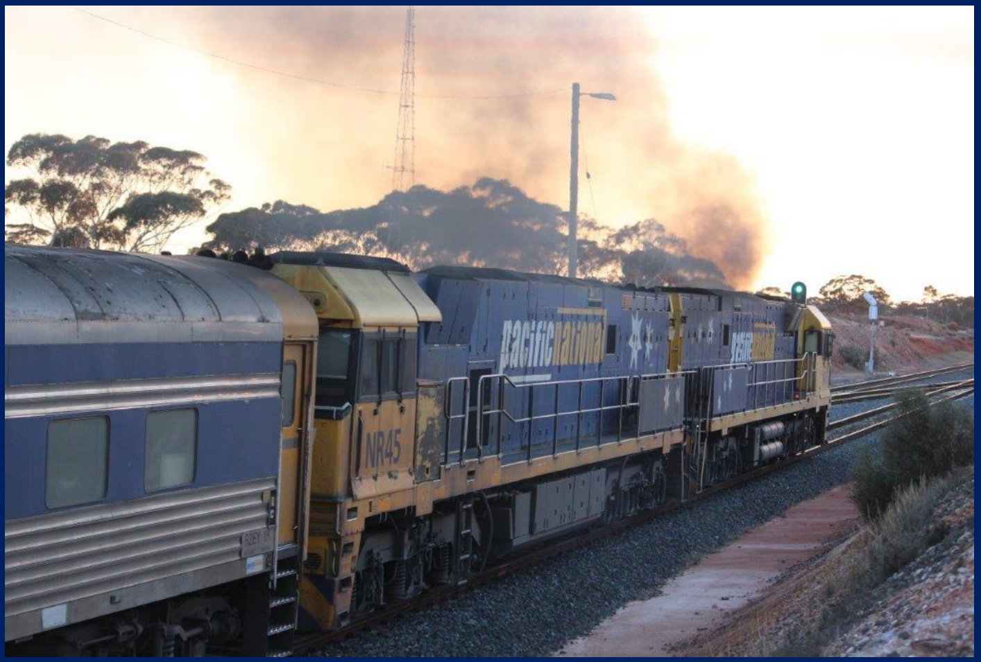
NR15 & NR45 on 2SP7 departing West Kalgoorlie for Perth Freight Centre 25/10.