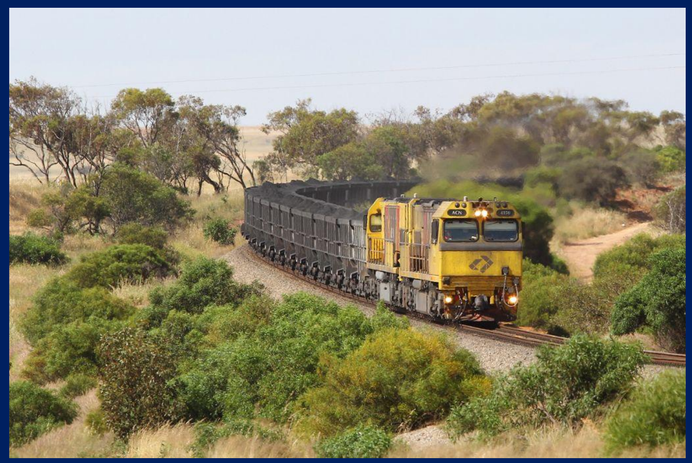
ACN4150 & ACN4148 on 7763 Karara ore Mickos dip Moonyoonooka October 21st.