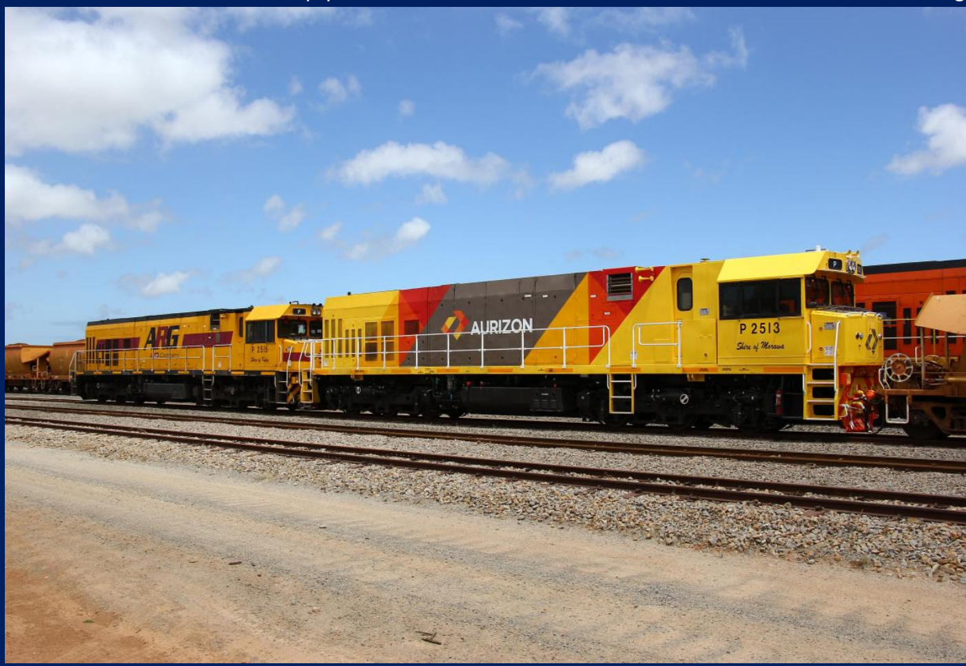
P2515 & P2513 recently transferred from South West in Narngulu yard 23/10.