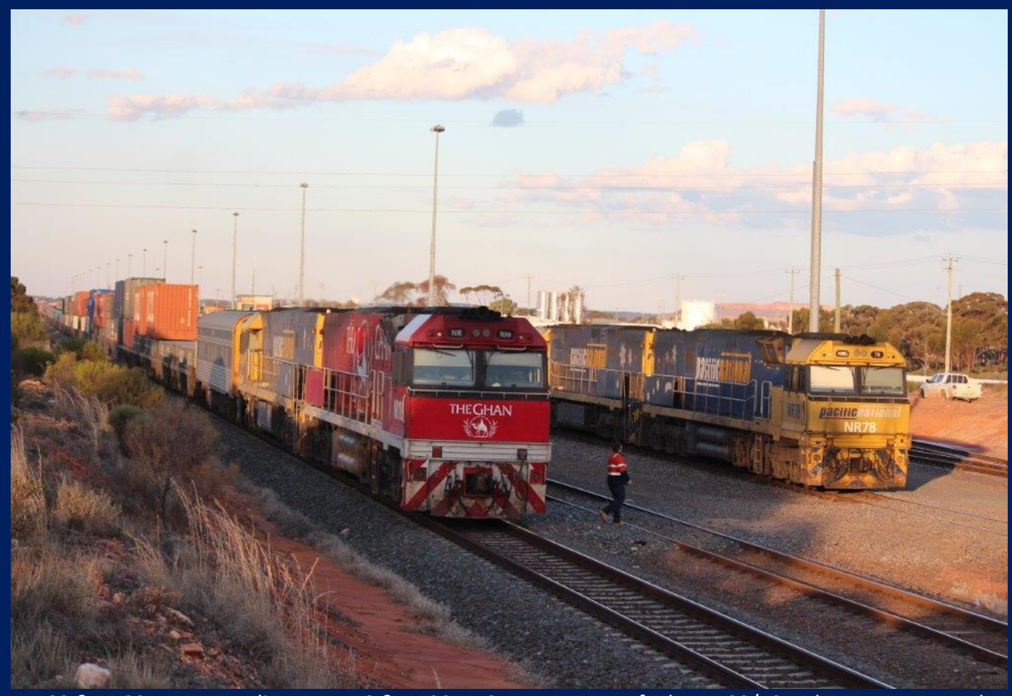
NR109 & NR99 on 7MP5 adjacent NR78 & NR20 on 2445 Esperance fuel WEK 23/10.