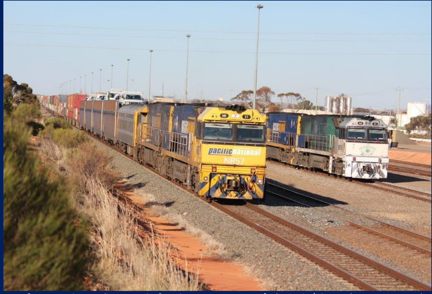
NR57 & NR44 on 2MP5 adjacent NR85 & NR6 on 4445 Esperance fuel WEK 25/10.