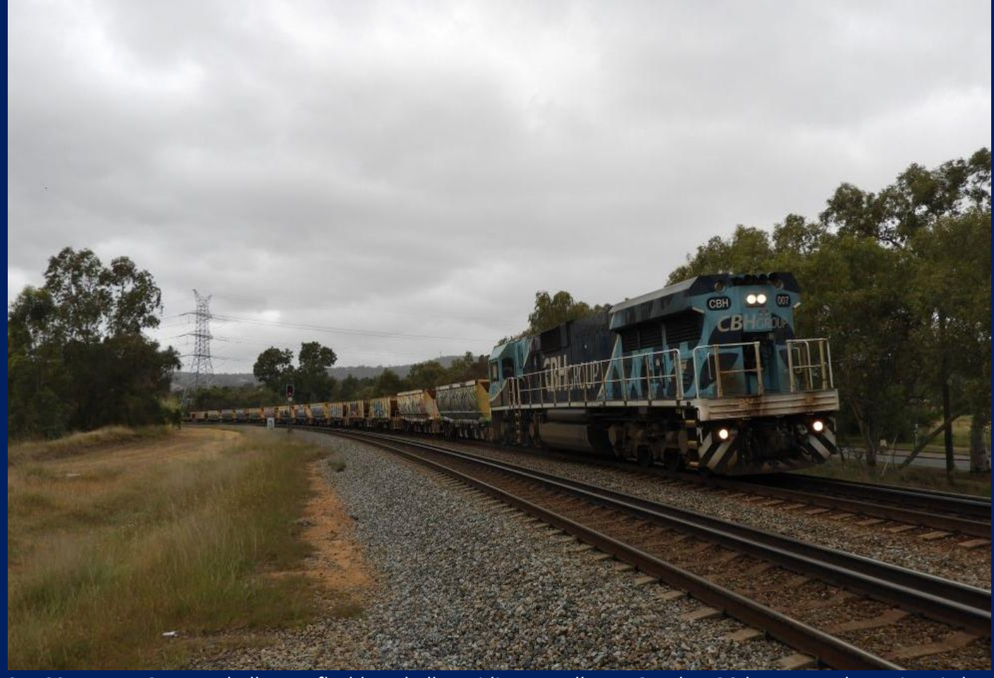
CBH007 on 5BT2 empty ballast to flashbutt ballast siding at Bellevue October 26th.