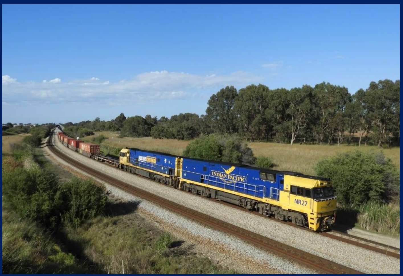
NR27 & NR51 on 1PS6 intermodal South Guildford October 22nd.