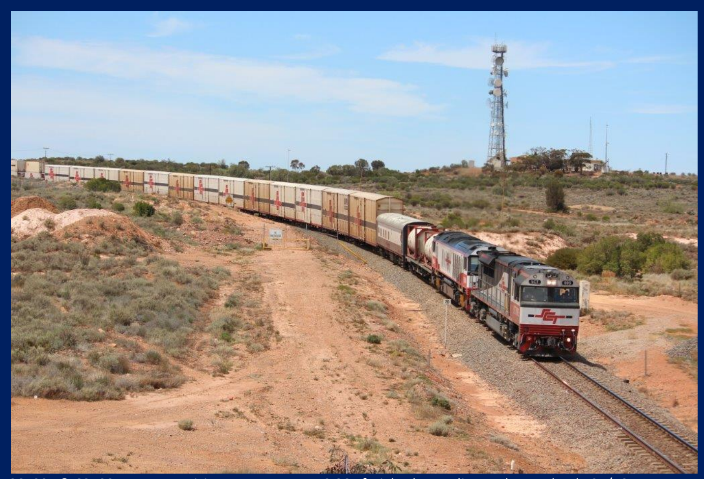
SCT005 & CSR004 now rare visitor to WA on 5MP9 SCT freight descending Parkeston bank 21/10.