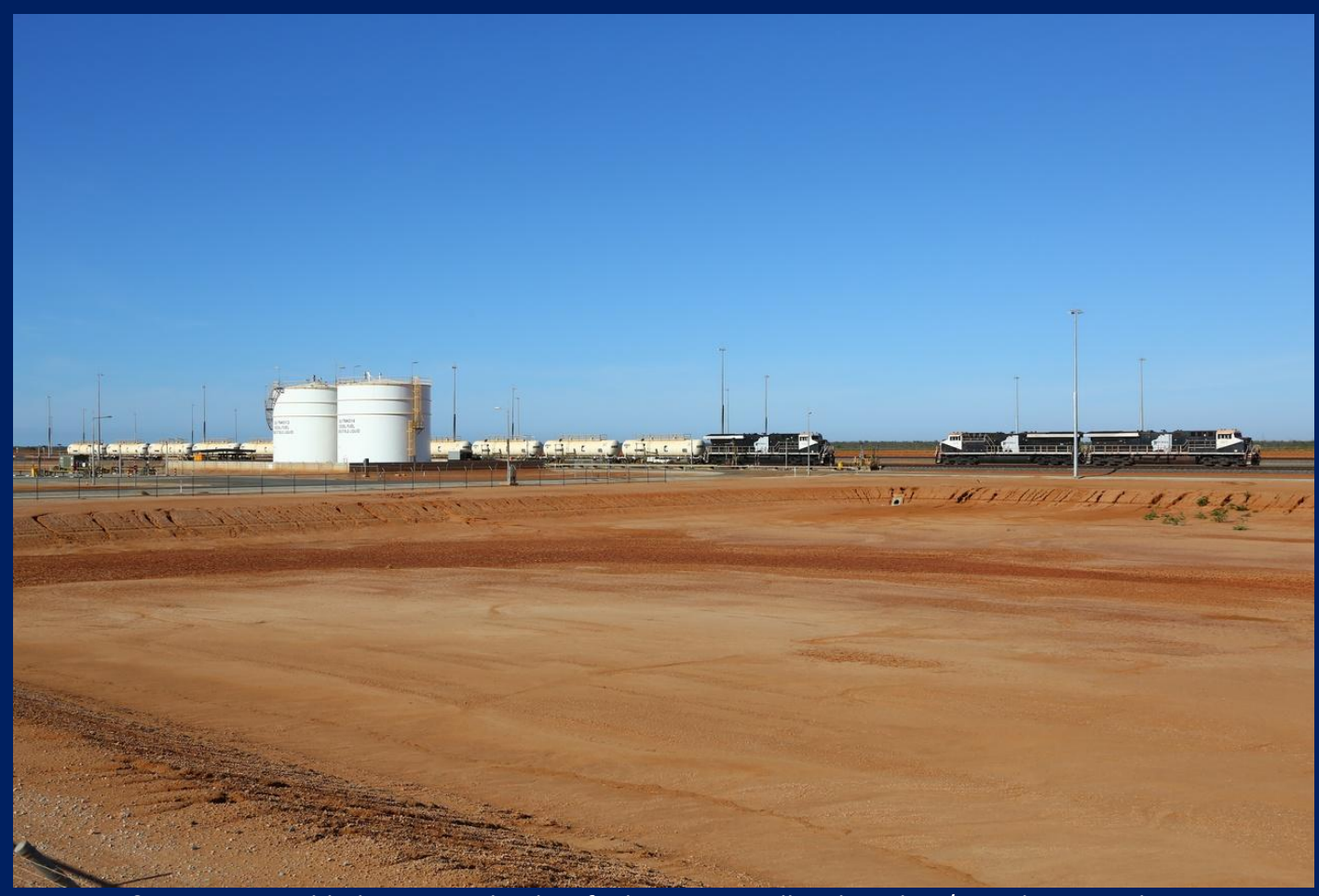
RHA1017 & RHA1015 stabled RHA1020 loading fuel train Roy Hill Tad Yard 18/10.