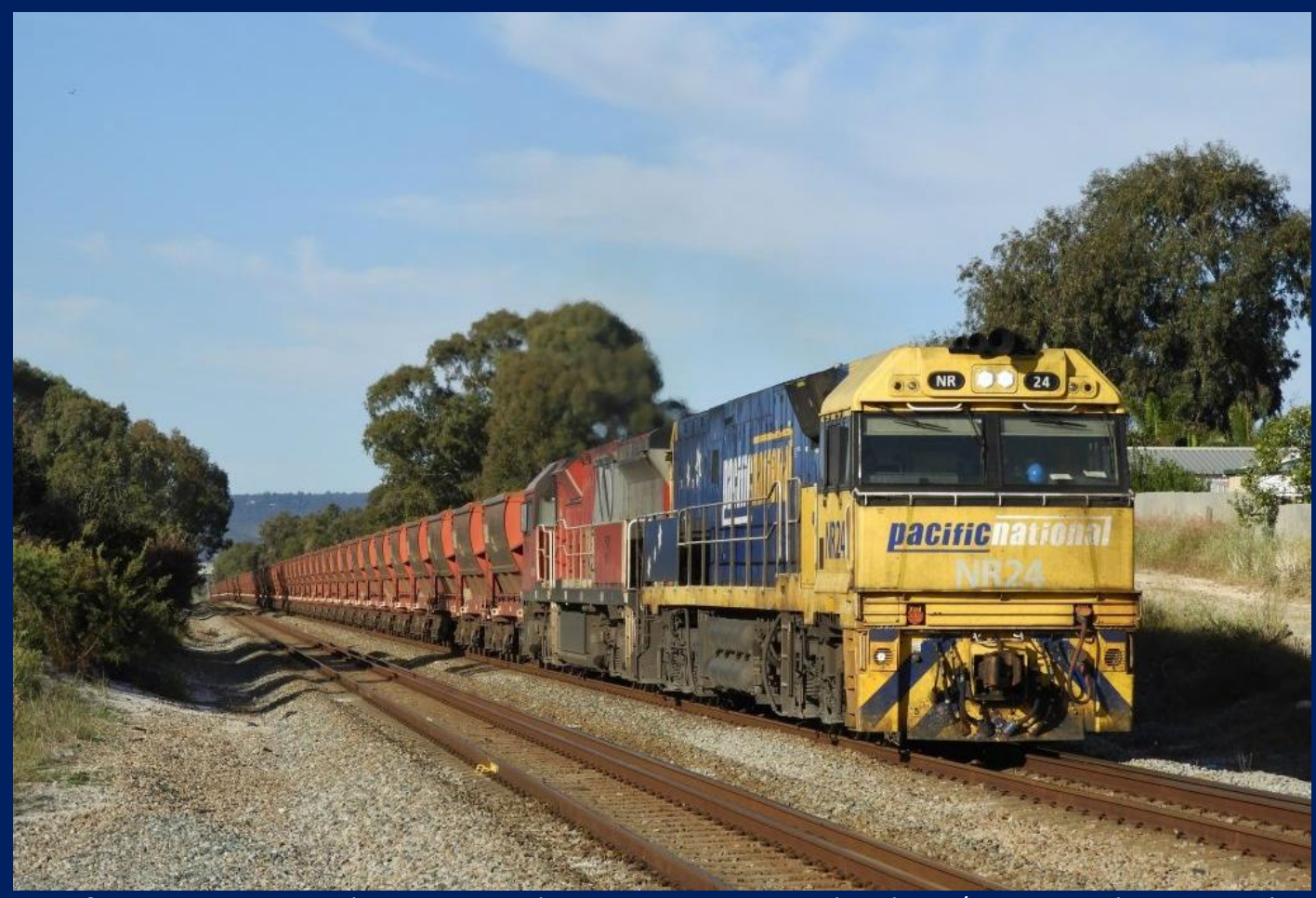
NR24 & MRL001 on 6030 Polaris ore Mt Walton to KBT Kwinana at Thornlie 19/10.