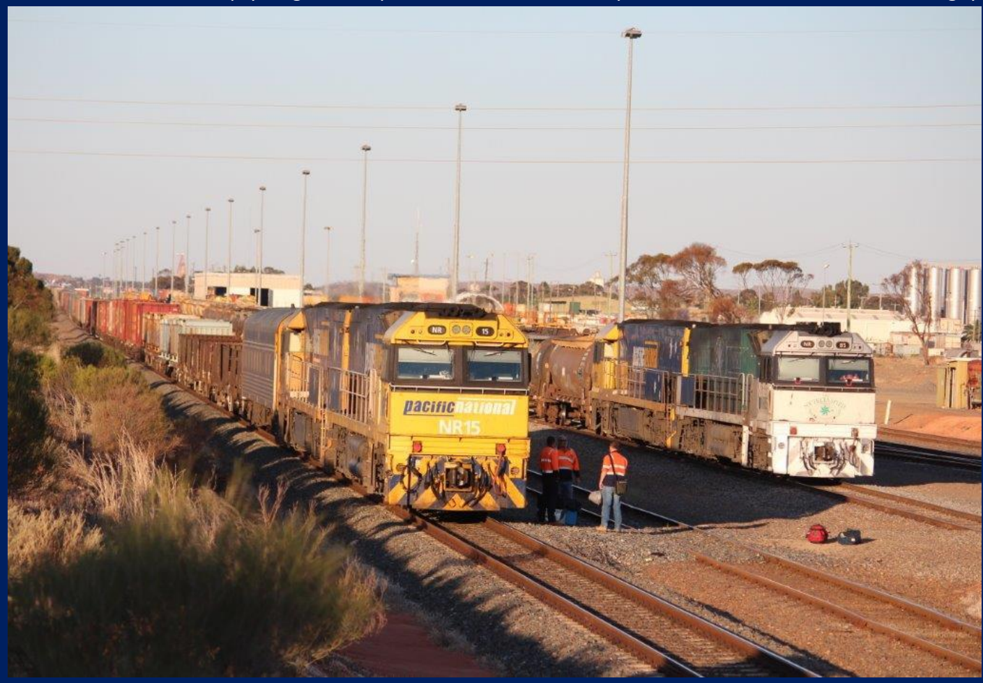
NR15 & NR45 on 2SP7 arriving WEK still with 4445 in yard October 25th.