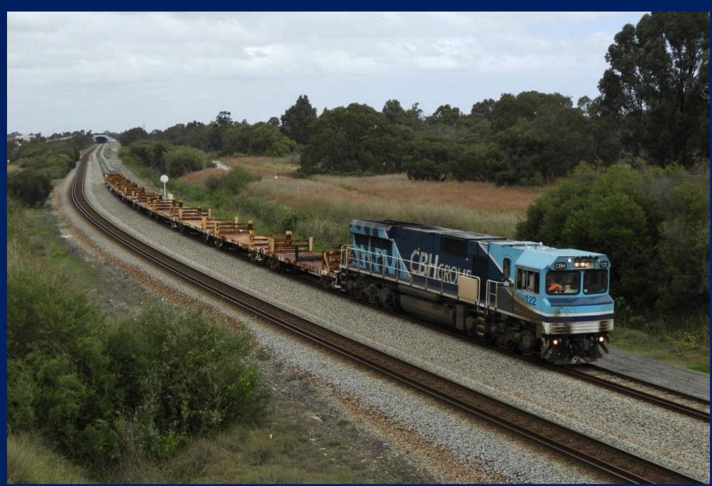
CBH122 on 3RT1 empty rail train Forrestfield to flashbutt siding Midland 17/10.