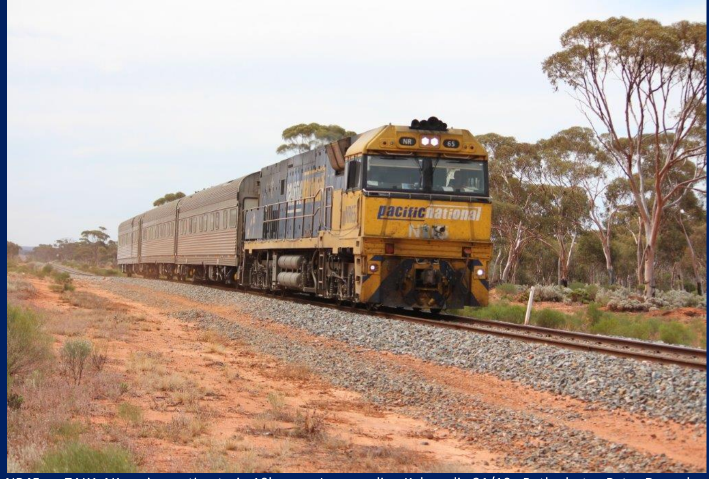
NR45 on 7AK1 AK car inspection train 10km peg Leonora line Kalgoorlie 21/10.