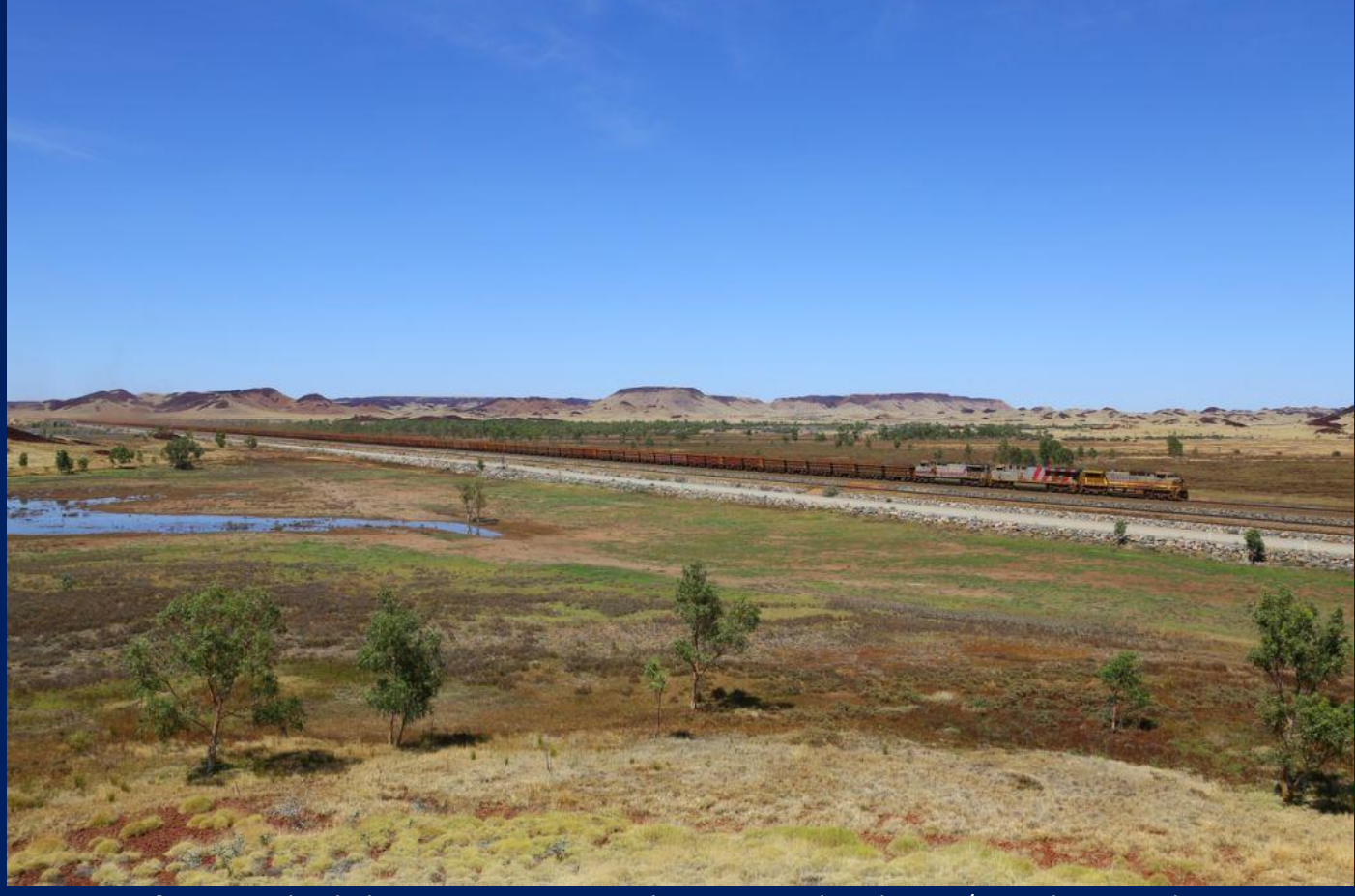
9429, 8132 & 7082 on loaded crossing causeway 51km Cape Lambert line 18/10.