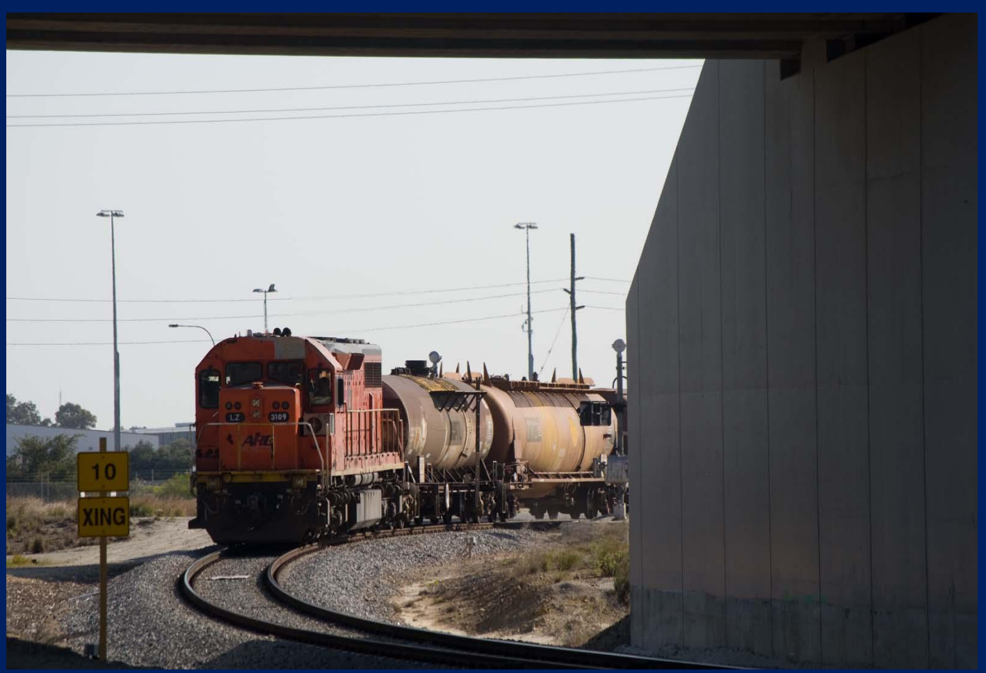
LZ3109 on 4SG4 BP terminal Kewdale shunter returning with loaded tankers 4/10.