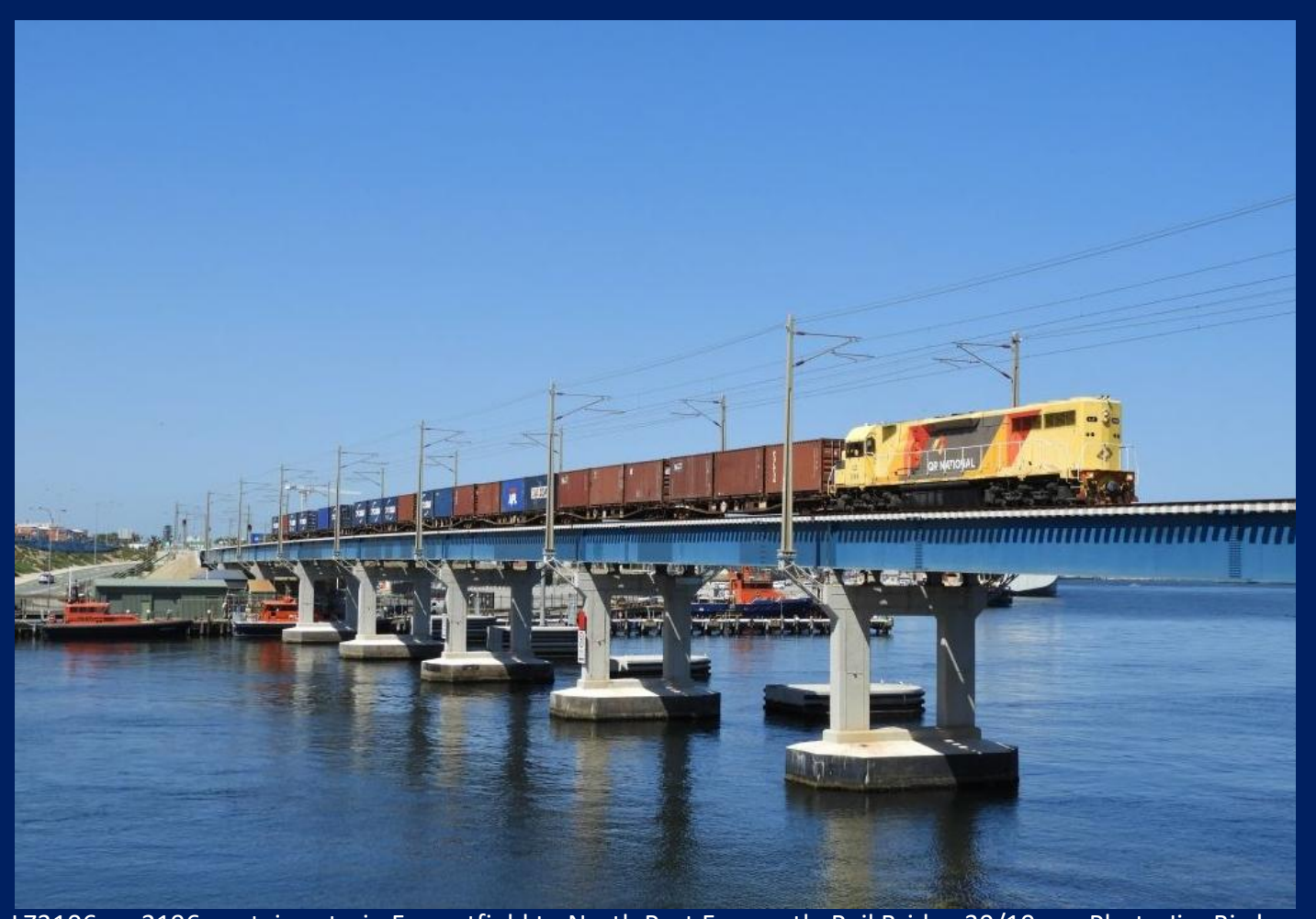
LZ3106 on 2196 container train Forrestfield to North Port Fremantle Rail Bridge 30/10.