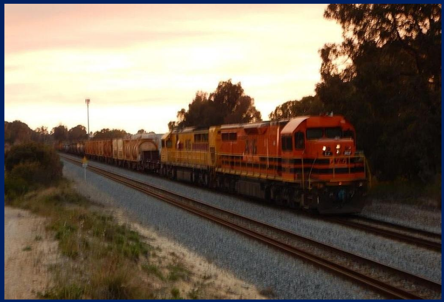
LZ3107 & Q4016 on 5025 Kwinana shunter to Forrestfield at dusk South Lake 5/10.