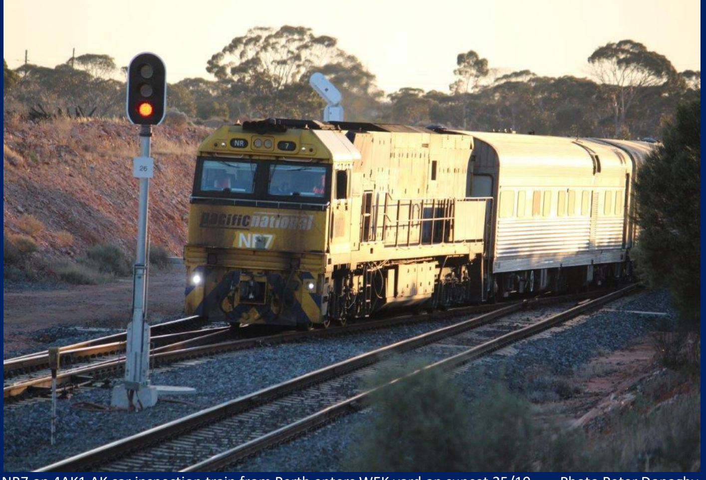
NR7 on 4AK1 AK car inspection train from Perth enters WEK yard on sunset 25/10.