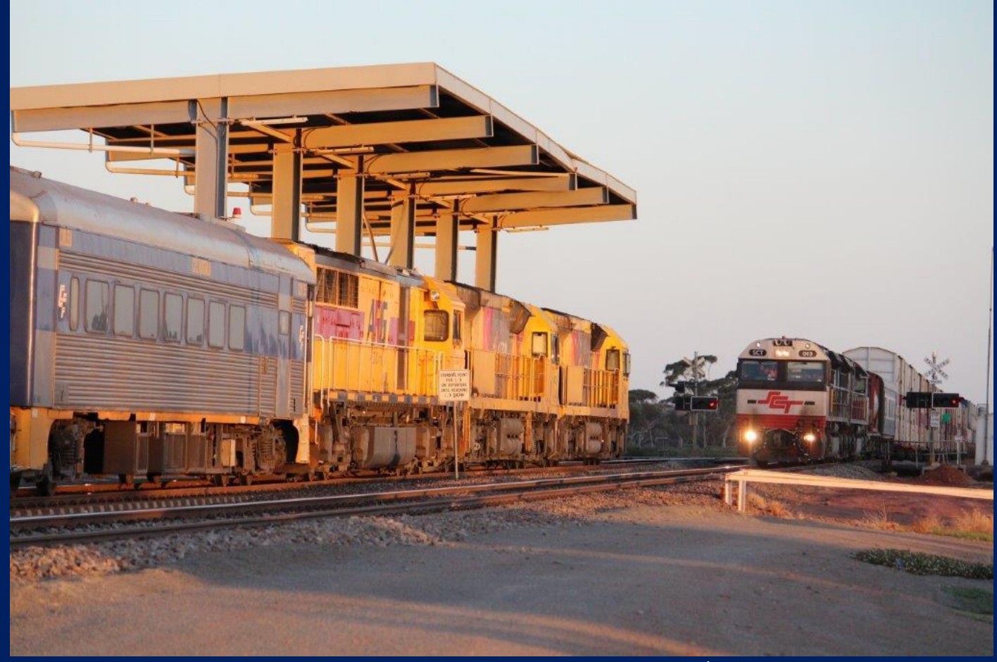
7PM1 crosses late SCT013 & SCT005 on 5MP9 freight east end Parkeston 28/10.