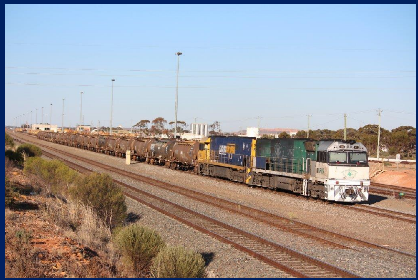
NR85 & NR6 on 4445 empty Kalgoorlie Esperance fuel train in WEK yard 25/10.