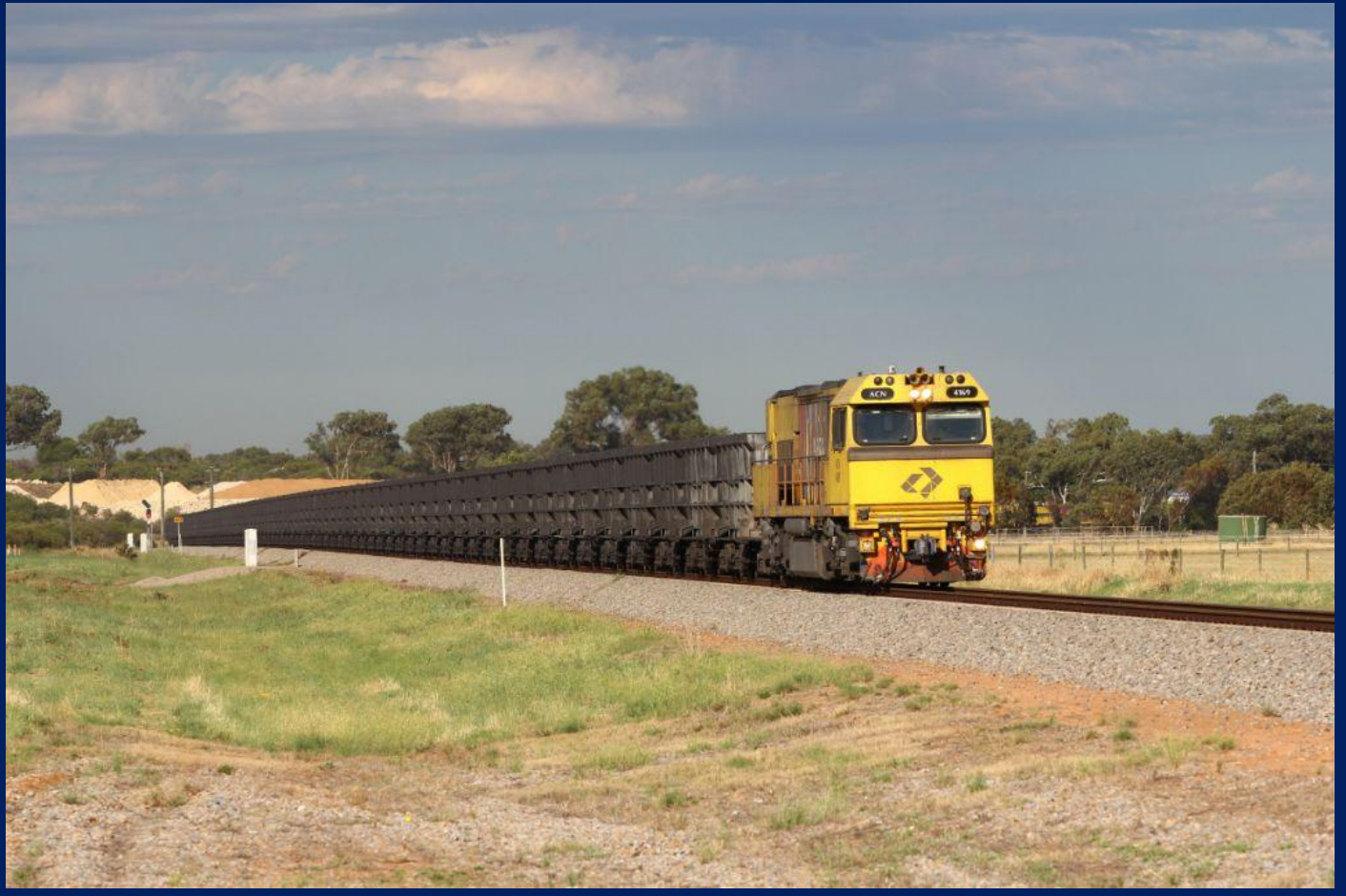
ACN4169 on 7762 empty Karara ore to Narngulu East October 21st.