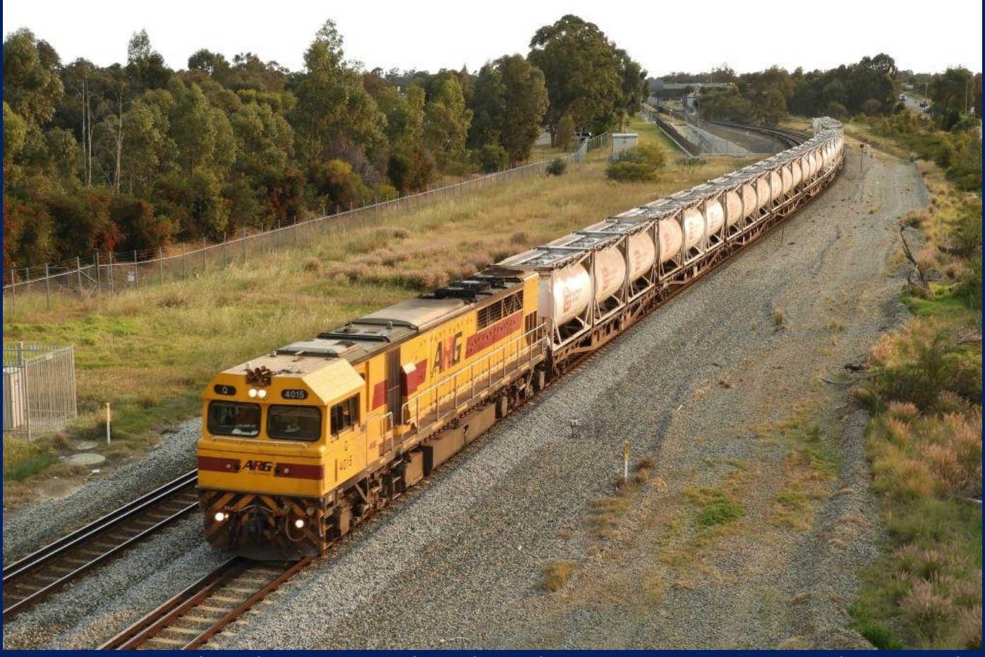
Q4015 on 6197 Soundcem shunter at Kenwick October 20th.