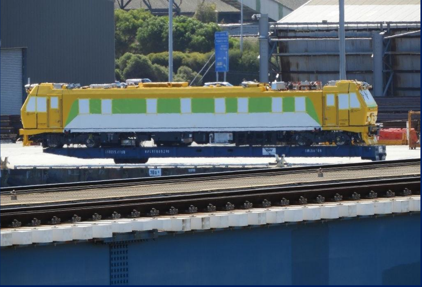
PTA new track recorder car on RO/RO float on 12 North Wharf Fremantle October 8th.