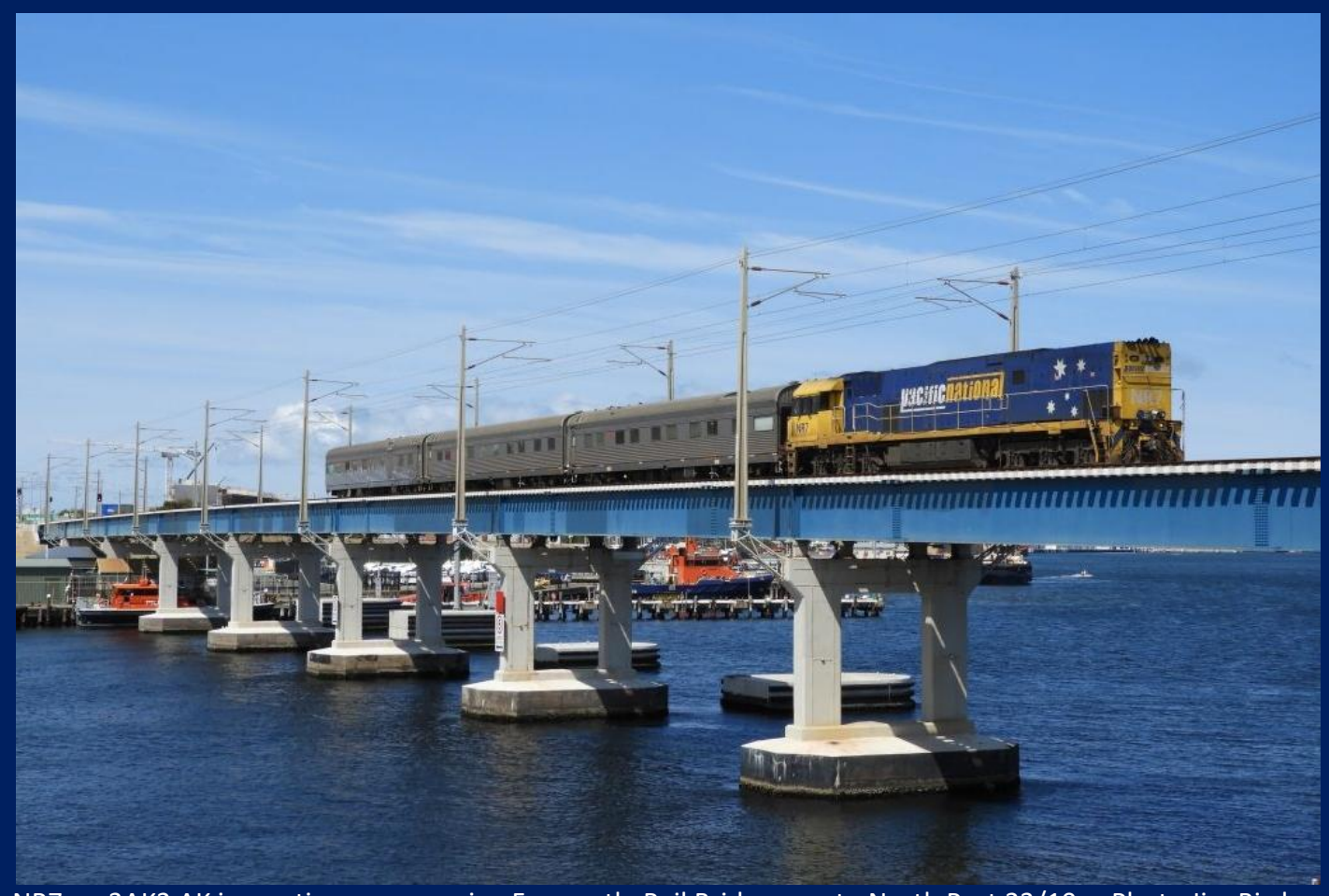
NR7 on 3AK2 AK inspection cars crossing Fremantle Rail Bridge way to North Port 23/10.