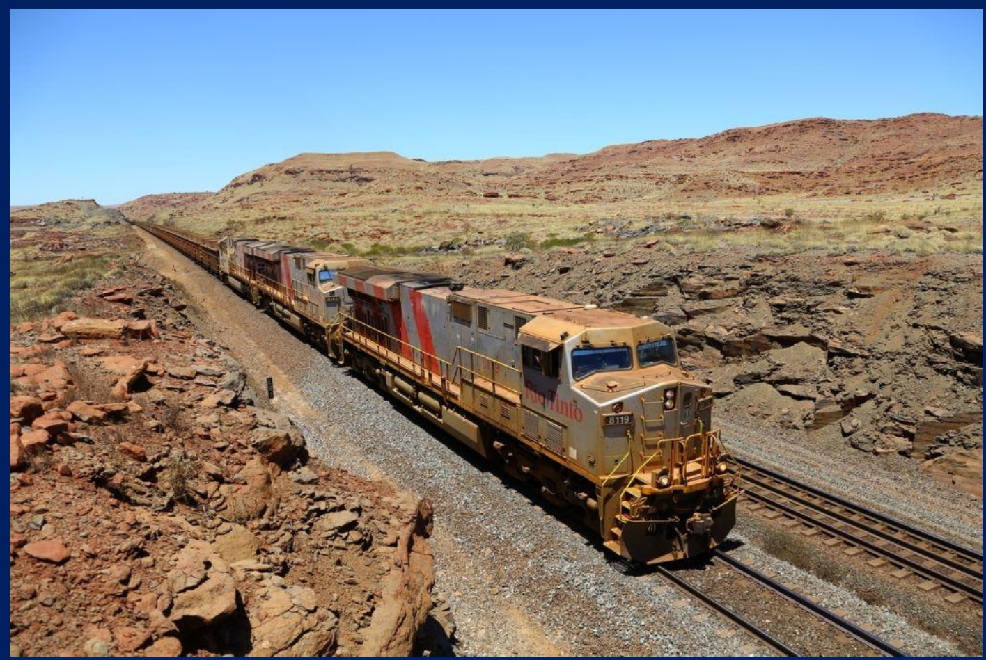
8119, 8182 & 8179 on loaded ore to Cape Lambert descends grade EMU 18/10.