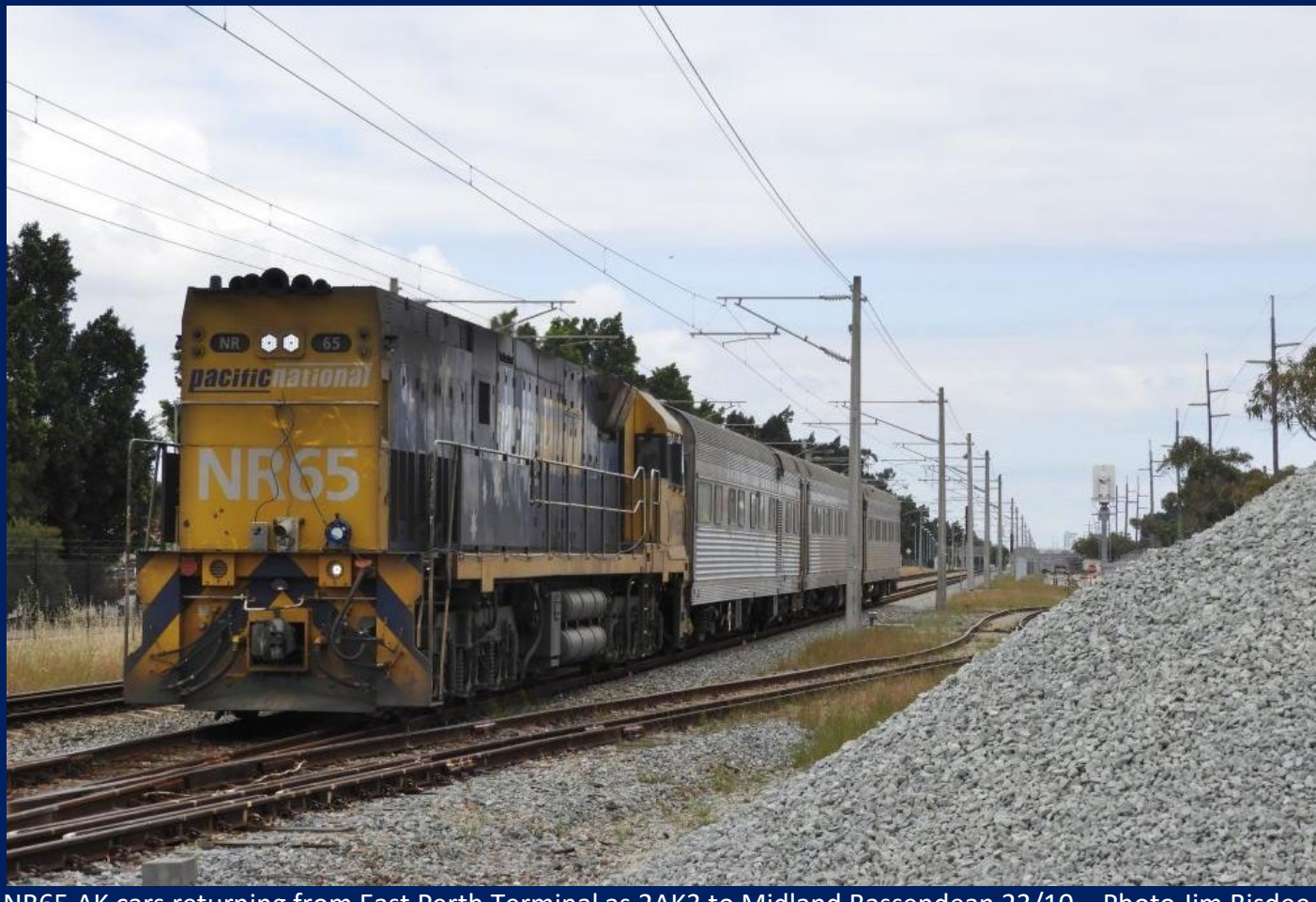
NR65 AK cars returning from East Perth Terminal as 2AK3 to Midland Bassendean 23/10.