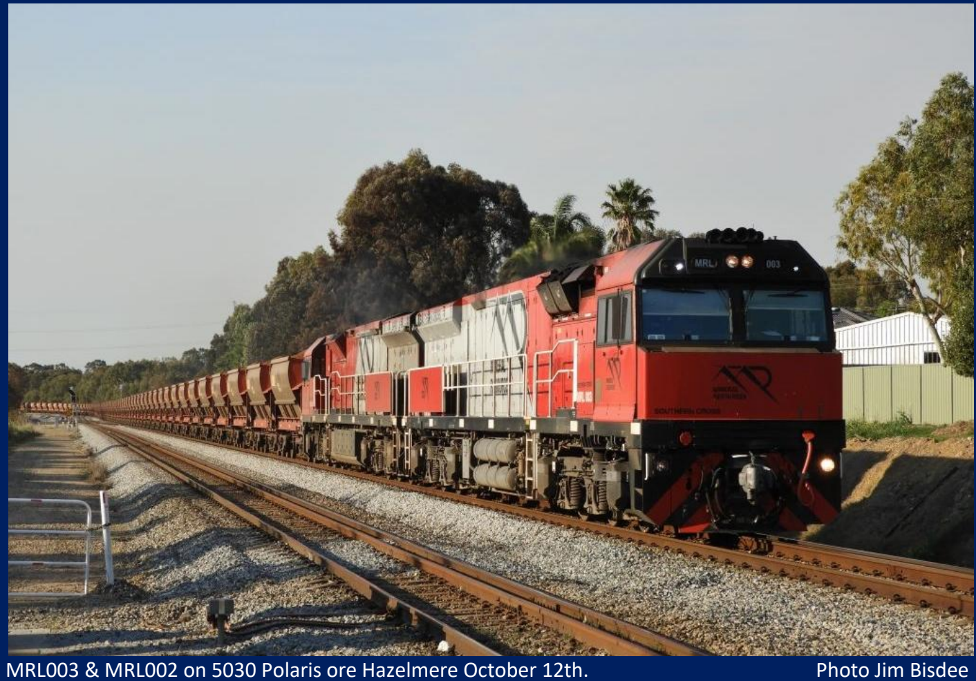
MRL003 & MRL002 on 5030 Polaris ore Hazelmere October 12th.