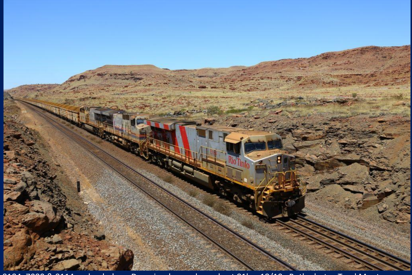
8184, 7080 & 8114 on loaded ore Dampier descends grade at 81km 18/10.