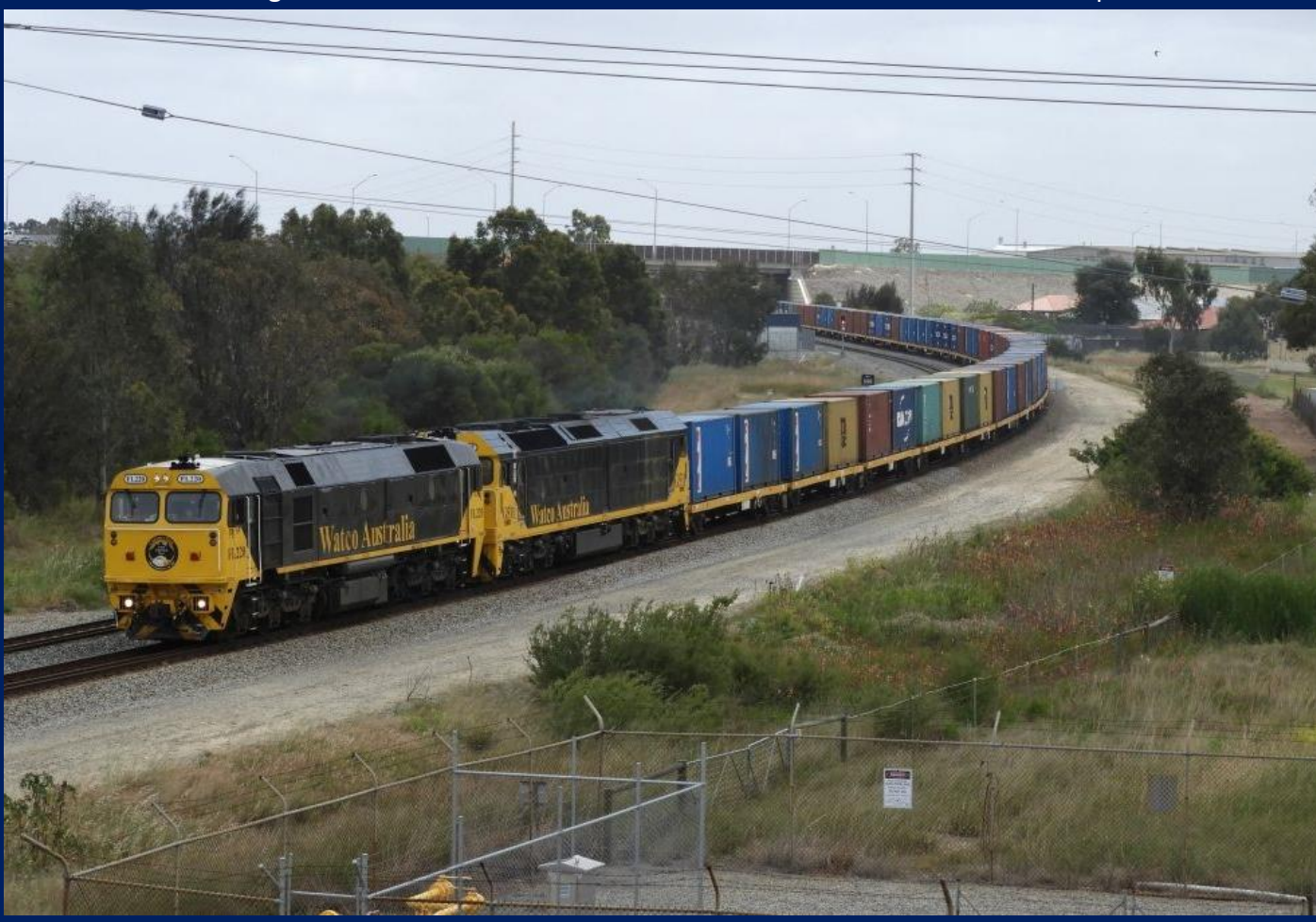
FL220 & G511 on 7142 Watco port shuttle ILS Forrestfield to North Port at Wattle Grove 28/10.