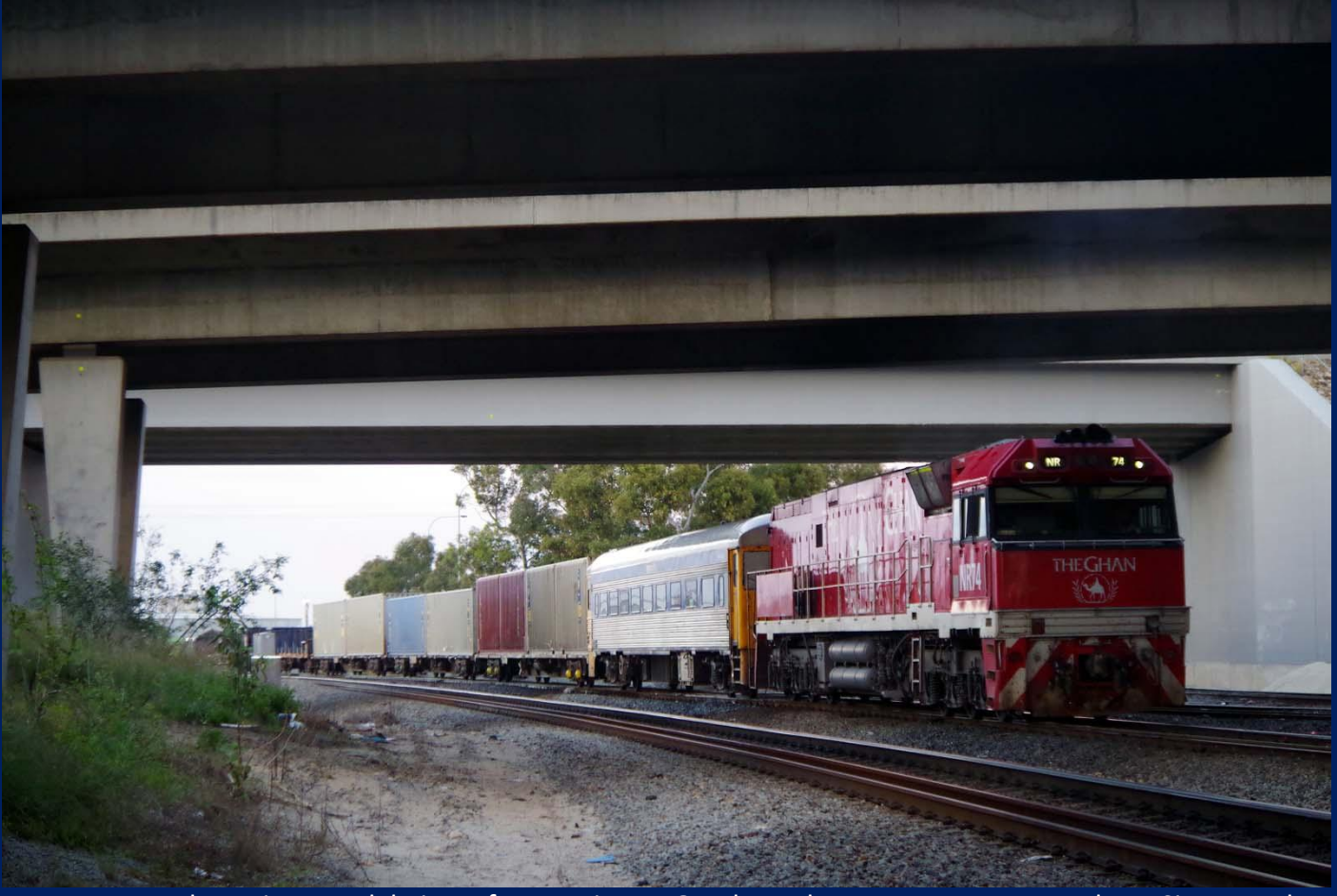
NR74 on 7PX4 departing Kewdale just after sunrise on October 7th.