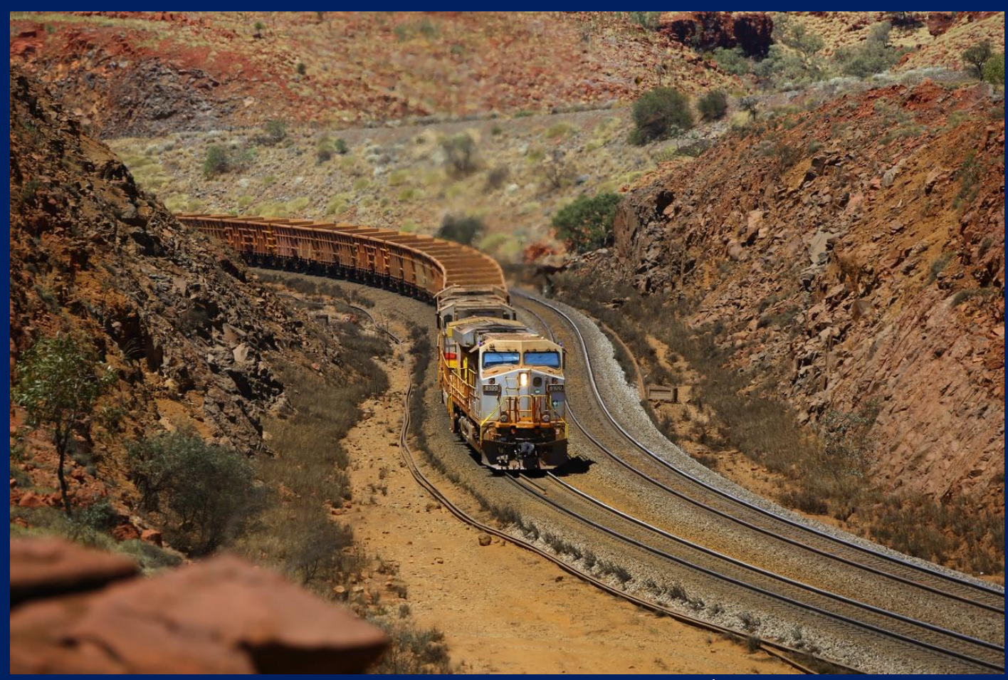
8100, 9422 & 8178 on empty ore climbs grade on west main line 91.3km 18/10.