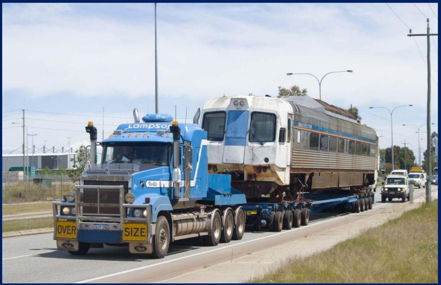
WCA903 Comeng Prospector car at Kewdale on way to WAFB training centre Forrestfield October 6th.