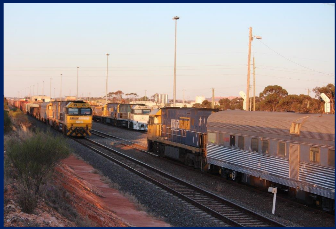
Triple cross 2SP7 and 4445 stabled cross NR7 on 4AK1 AK inspection train 25/10.