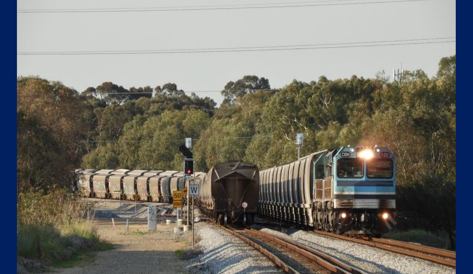
CBH122 & CBH120 on 5S56 Watco grain cross 5K25 empty grain Woodbridge 12/10.