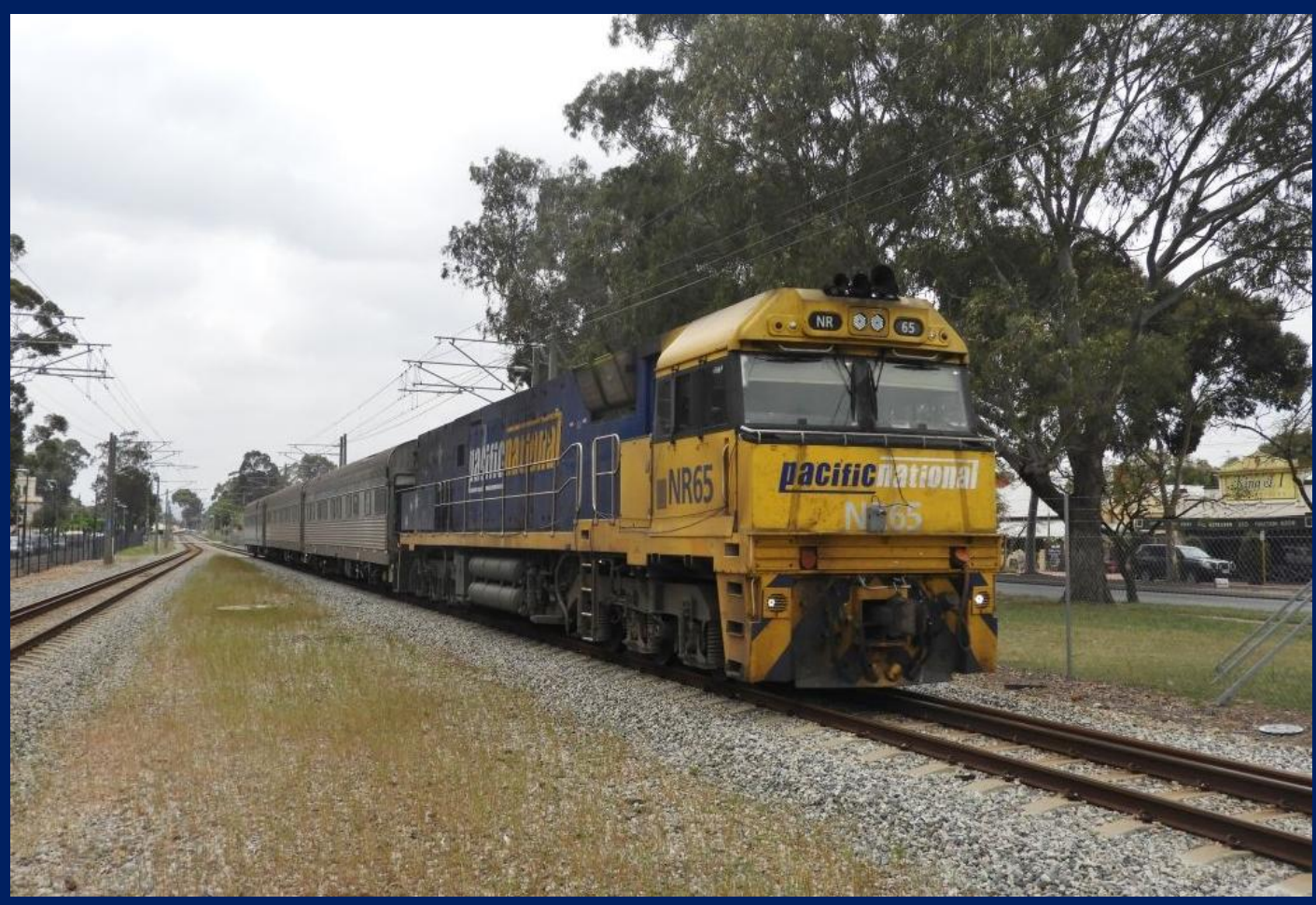
NR65 on 2AK2 AK inspection cars under wires at Guildford October 23rd.