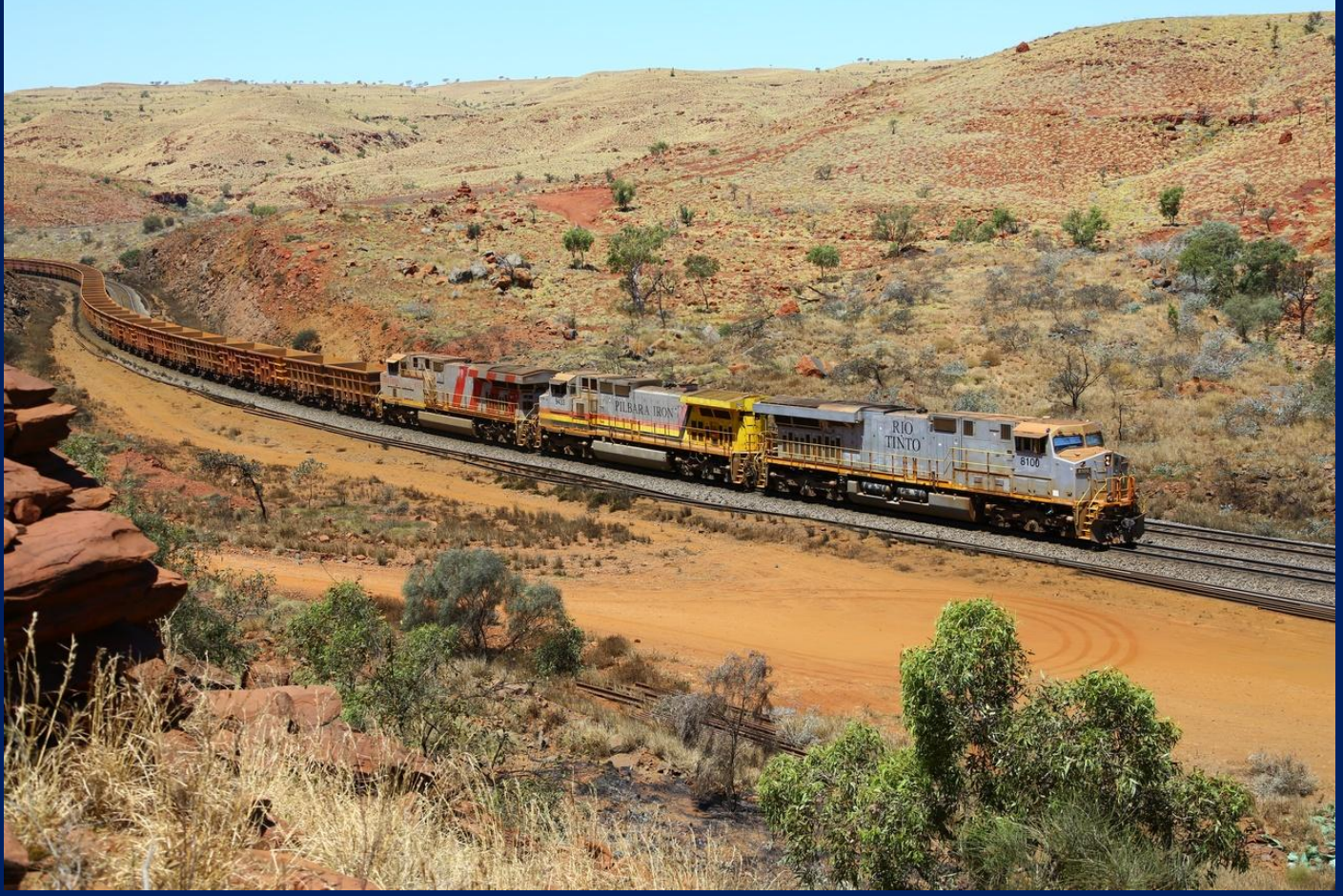
8100, 9433 & 8178 all different liveries on 240 car empty ore at 91.3km 18/10.