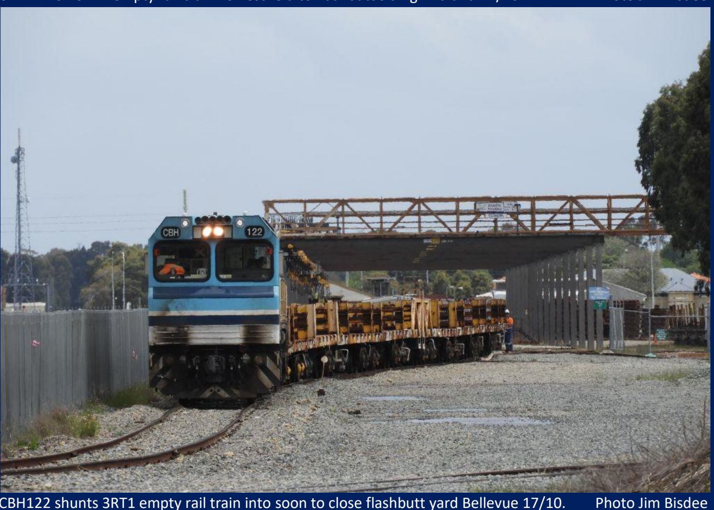
CBH122 shunts 3RT1 empty rail train into soon to close flashbutt yard Bellevue 17/10.