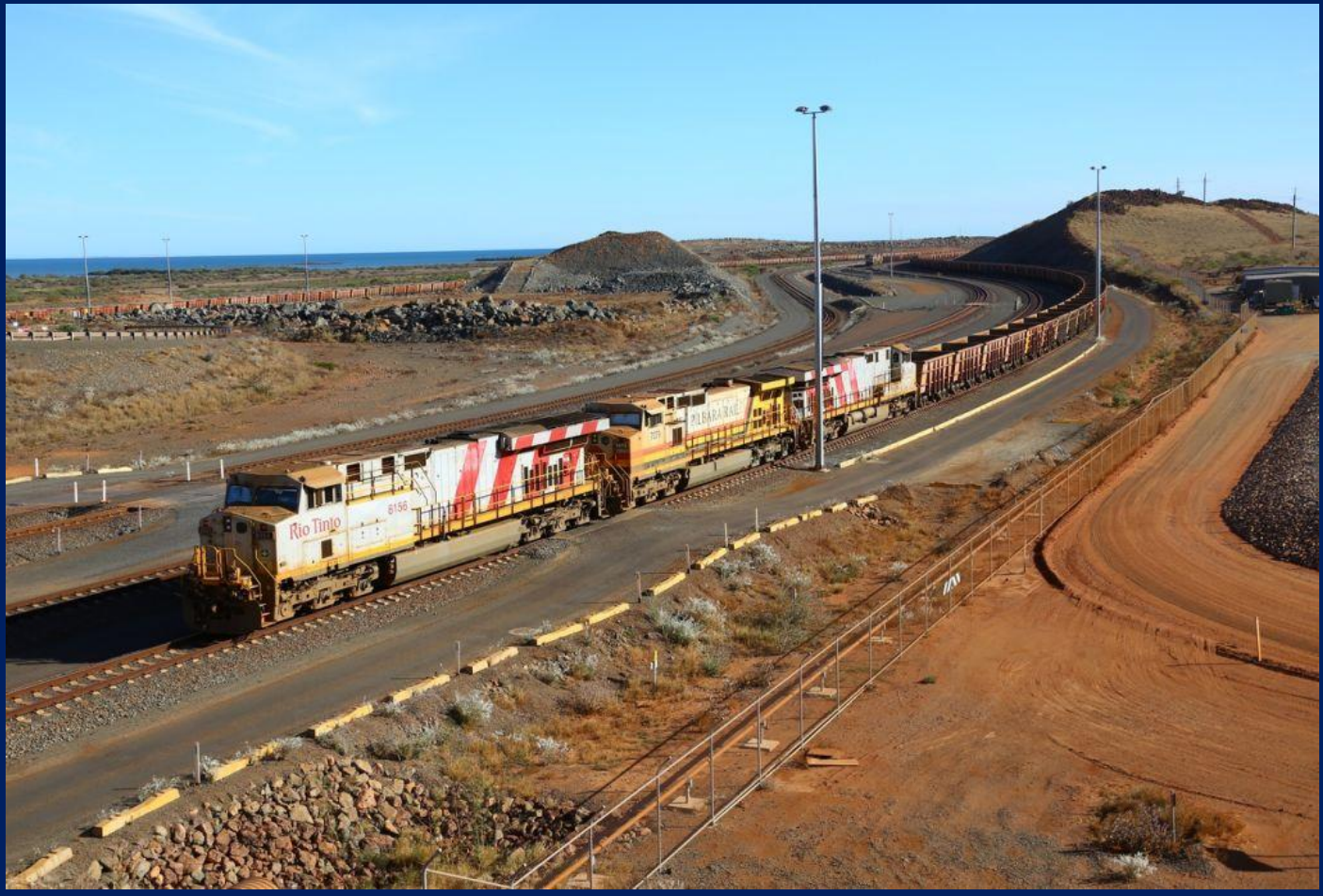
8156, 7079 & 8121 on empty ore ex CD2 on road 8 Cape Lambert October 18th.