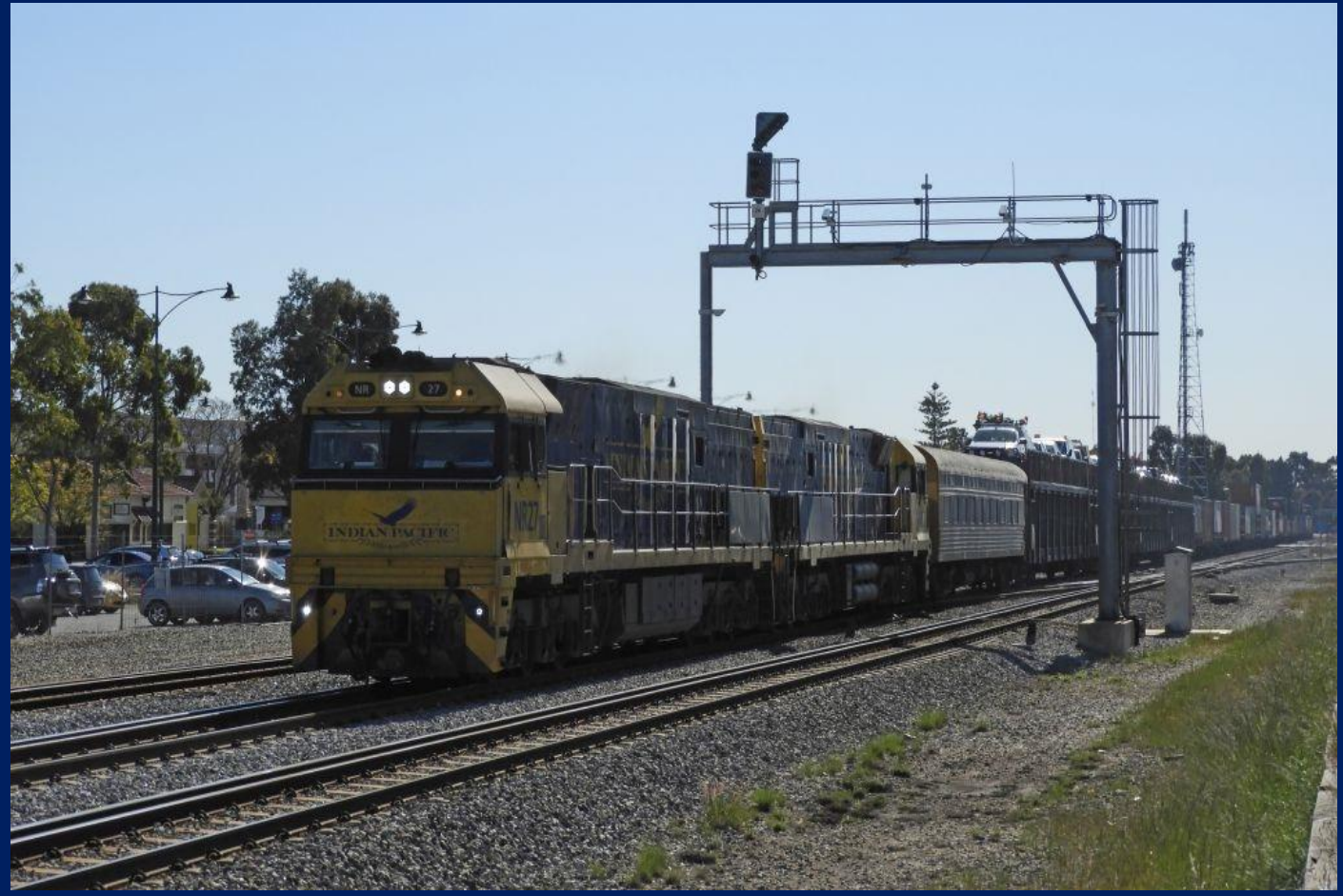
NR27 & NR25 on 5PM5 running wrong line thru Midland October 5th.