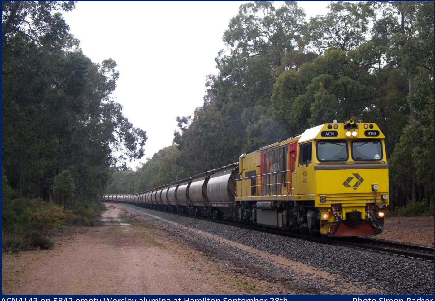
ACN4143 on 5842 empty Worsley alumina at Hamilton September 28th.