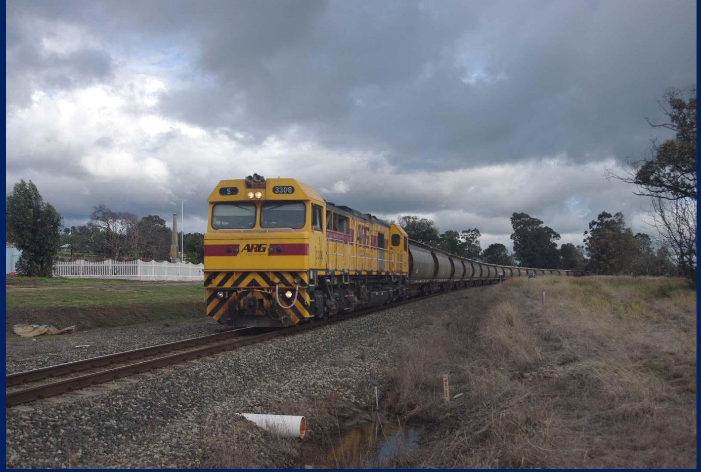
S3308 on 4884 empty Alcoa alumina running thru Yarloop on September 29th.