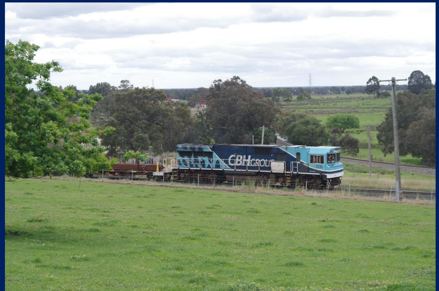
CBH006 on 6TR2 arc infrastructure Watco rail train Brunswick North September 29th.