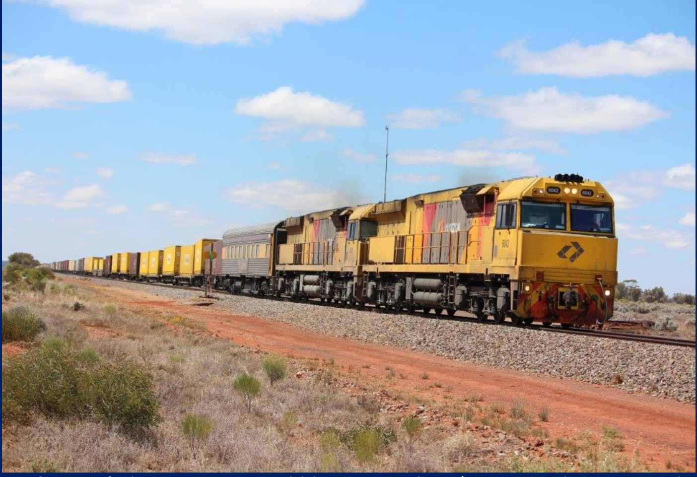
6042 & 6028 on final 5MP1 Aurizon intermodal departing Curtin loop 7/10.