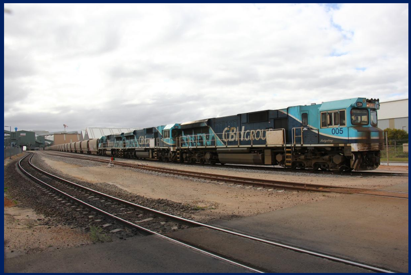
CBH005, CBH009 & CBH011 on empty Watco grain Geraldton Port to Mingenew 10/10.