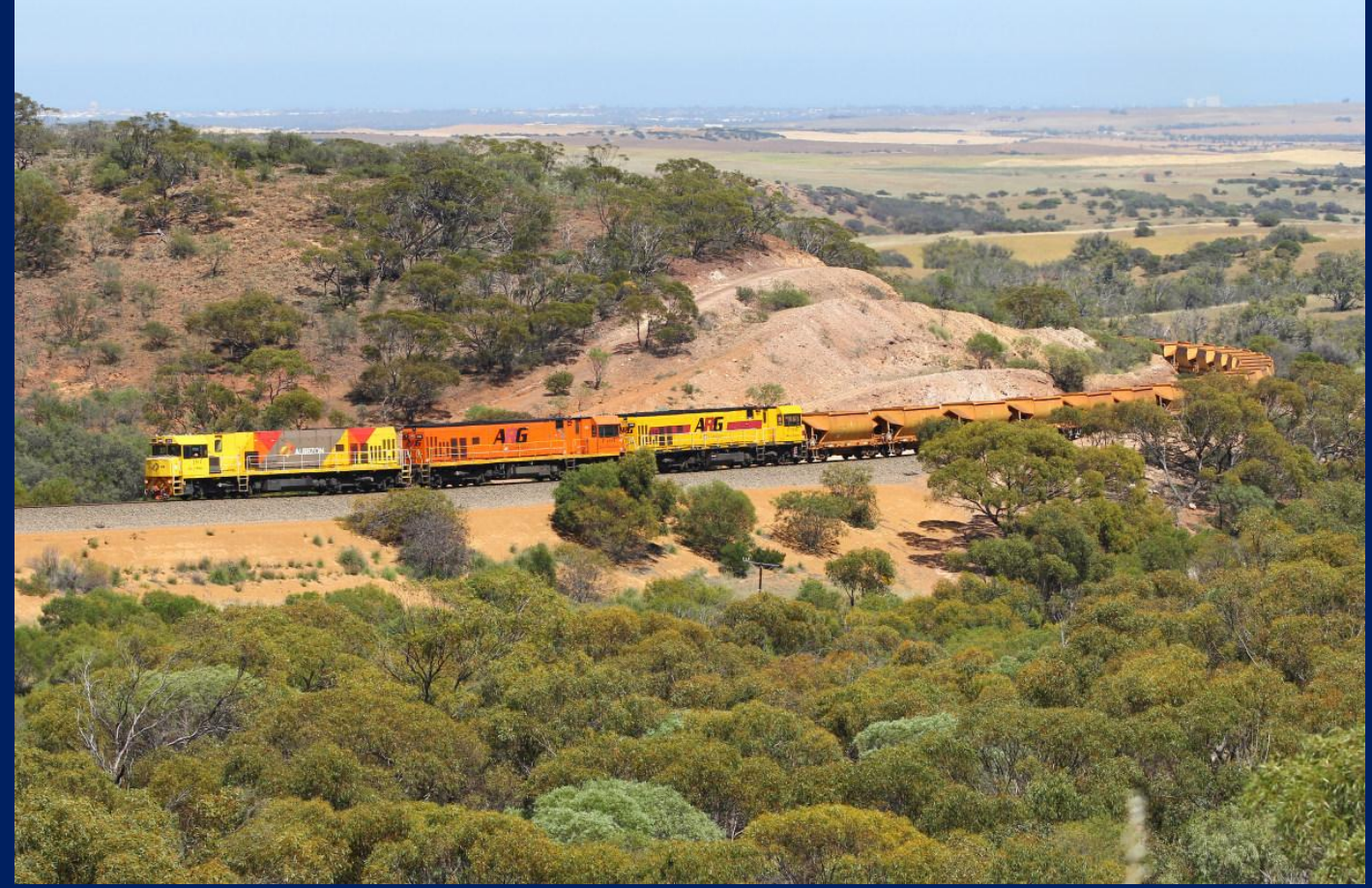
2512, P2509 & P2508 on 1720 empty Mt Gibson ore to Perenjori at Bringo October 15th.