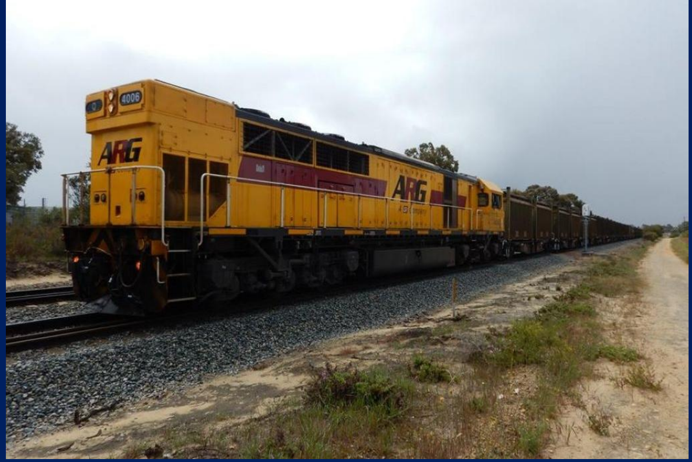
Q4010 long end 2430 empty sulphur as Kwinana triangle not in use Yangebup 10/10.