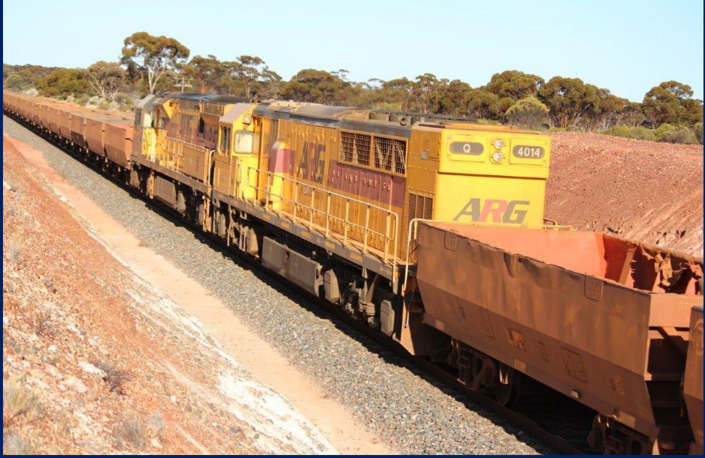
Q4014 & AC4306 DPU on 2414 empty ore 628km October 9th.