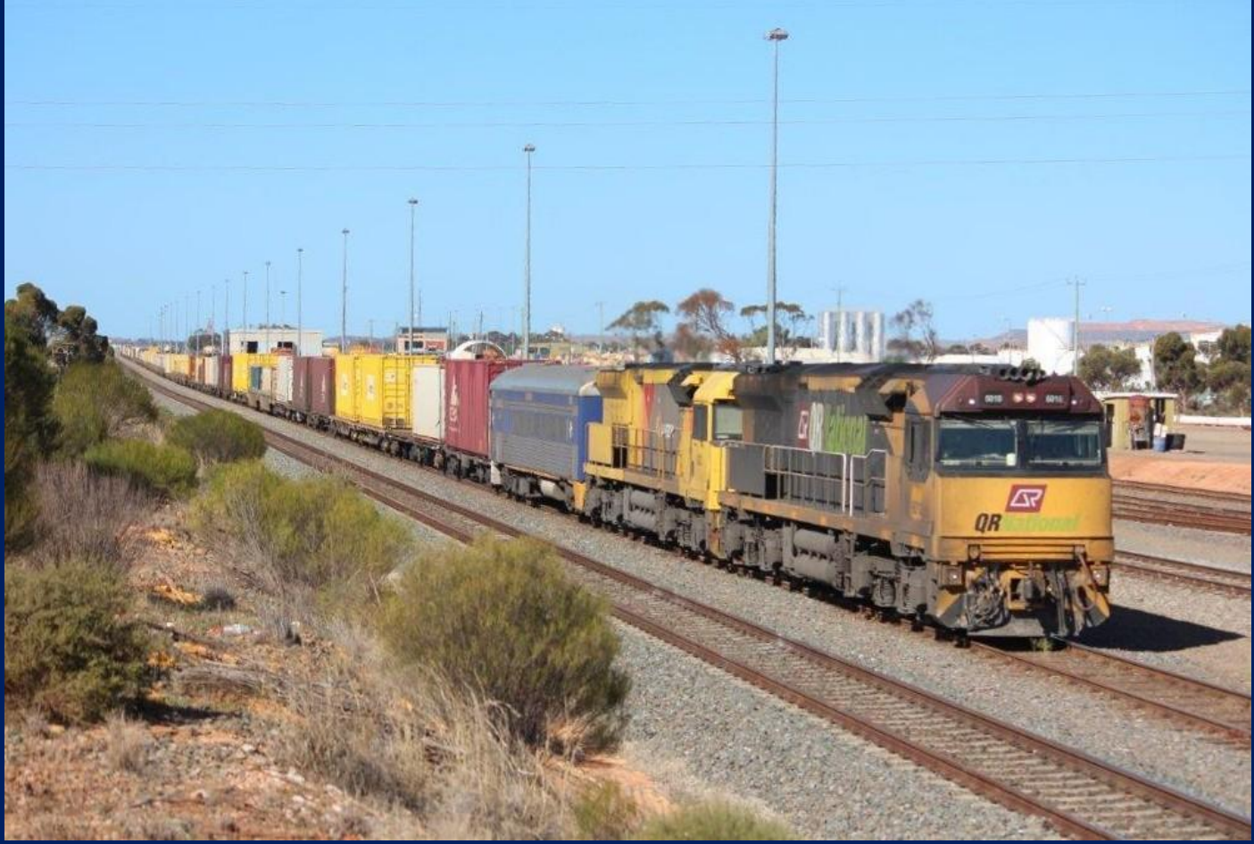
6010 & 6025 on MP5 arriving in West Kalgoorlie Yard October 19th.