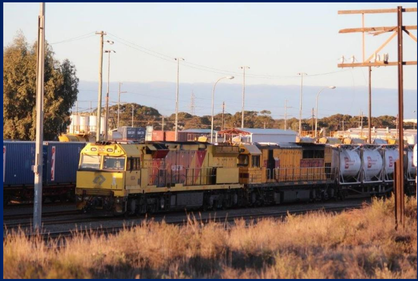
6024 now transferred to WA fleet leads Q4013 on 3025 freight into WEK 18/10.