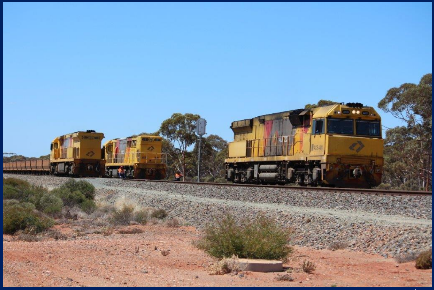
Engine change at Binduli Q4011 to run onto train replacing ACC6030 with ACB4301 then to lead 1414 8/10.