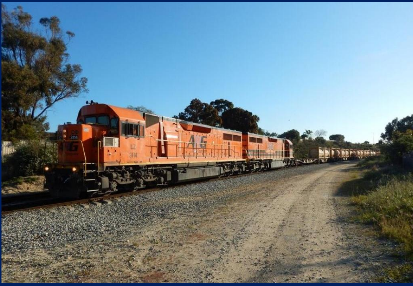
LZ3114 & LZ3111 on 1025 Kwinana shunter at Yangebup October 8th.