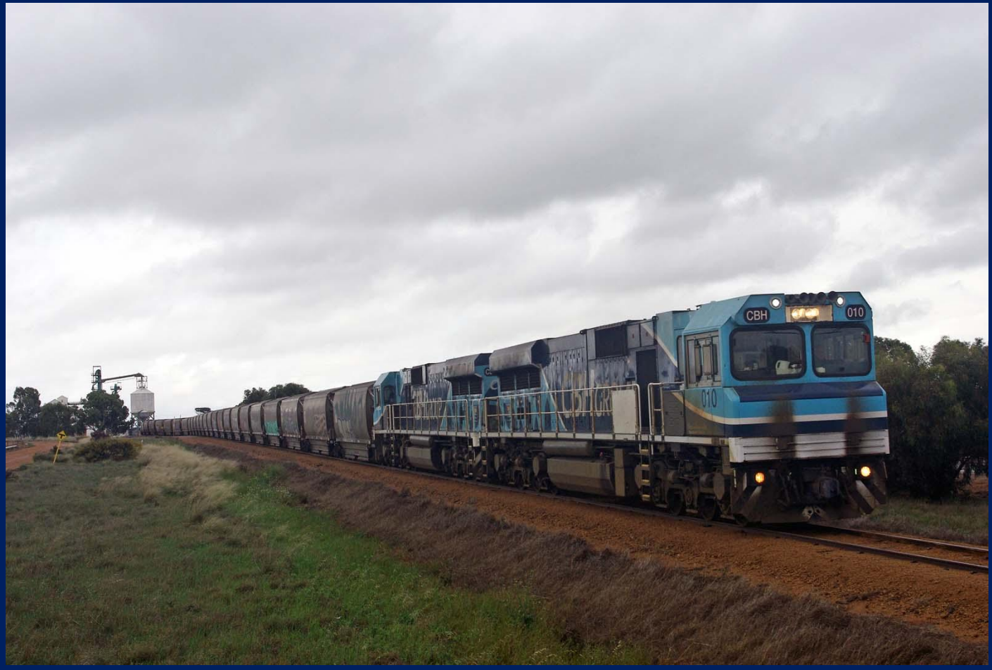
CBH010 & CBH001 on 1K24 Watco grain loading at McLevie September 24th.