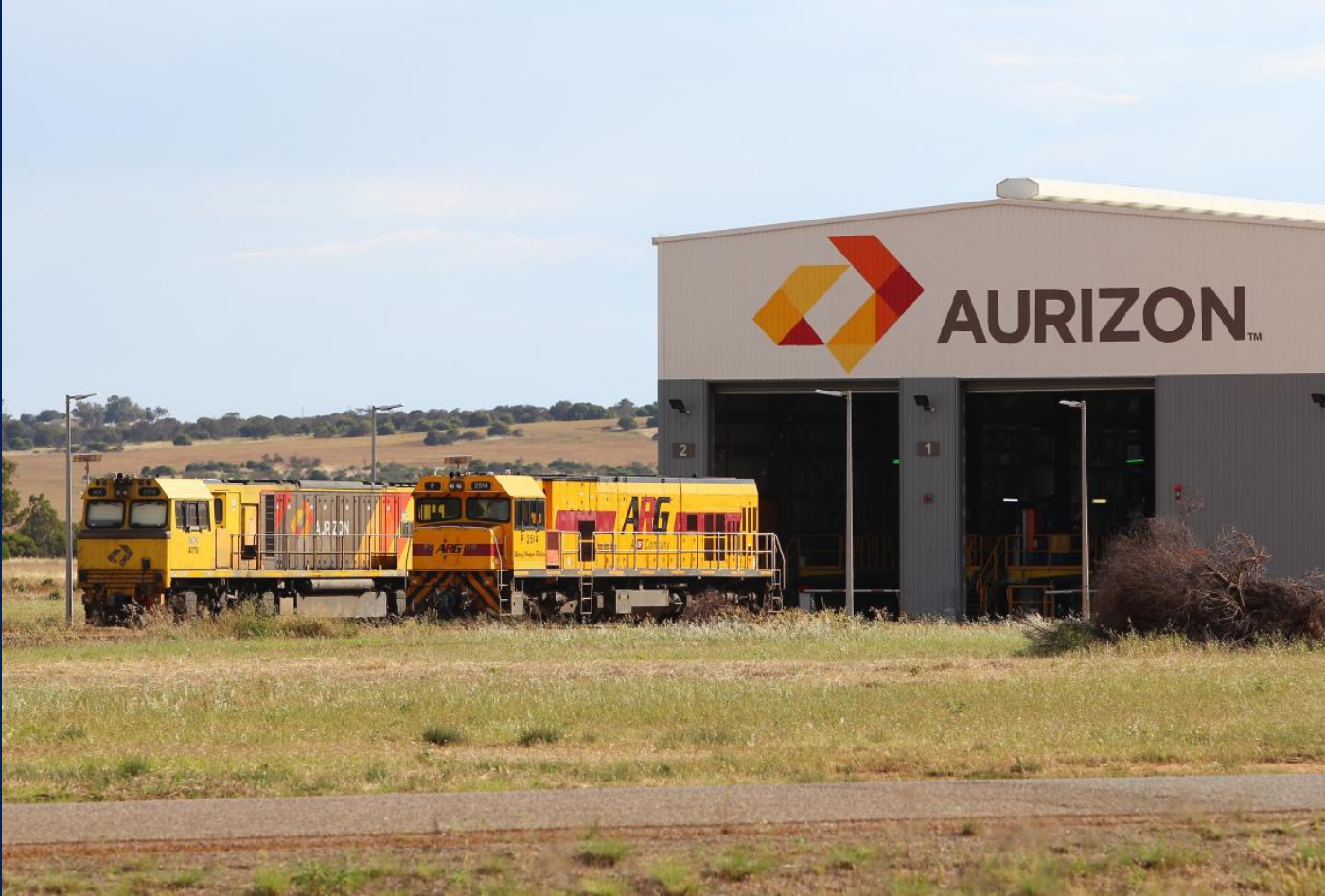
ACN4170 & P2514 outside Aurizon Narngulu East Loco Depot October 21st.