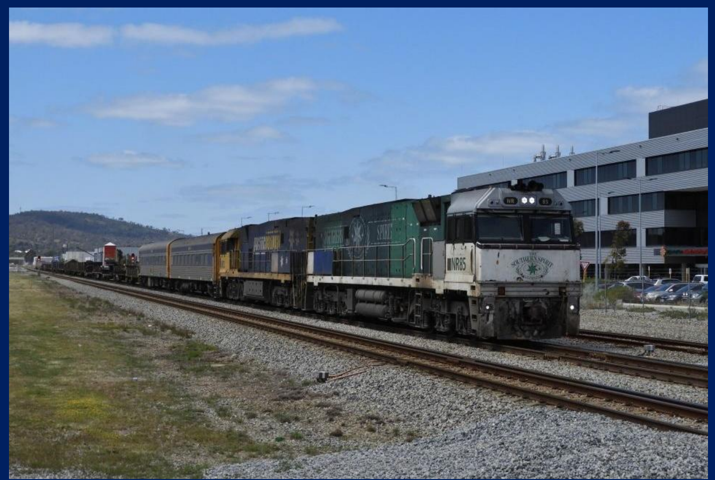
NR85 & NR52 on 1MP2 with only steel loading Midland October 4th.