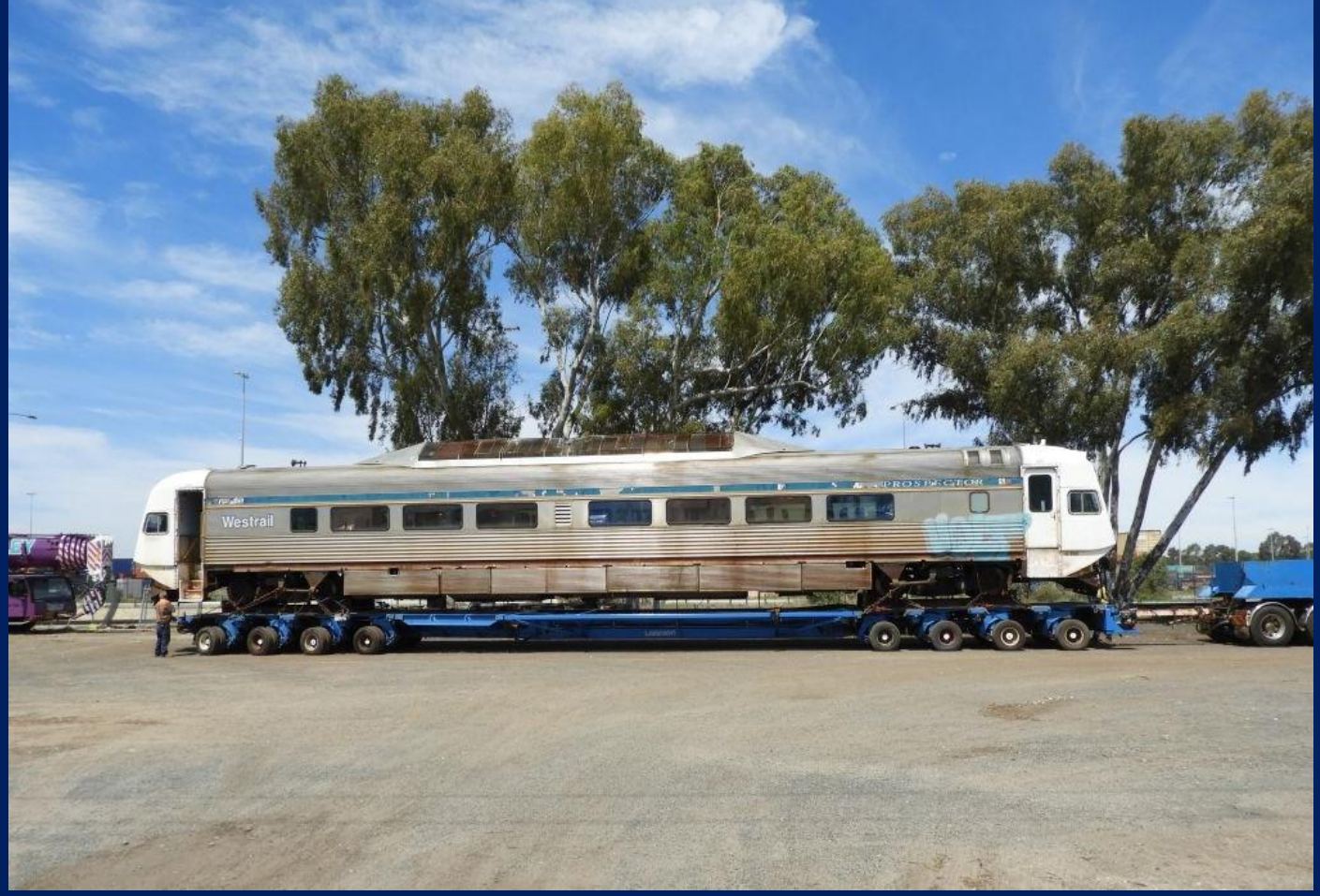
Comeng Prospector power car WCA903 on transport float at PTA Kewdale Depot 6/10.