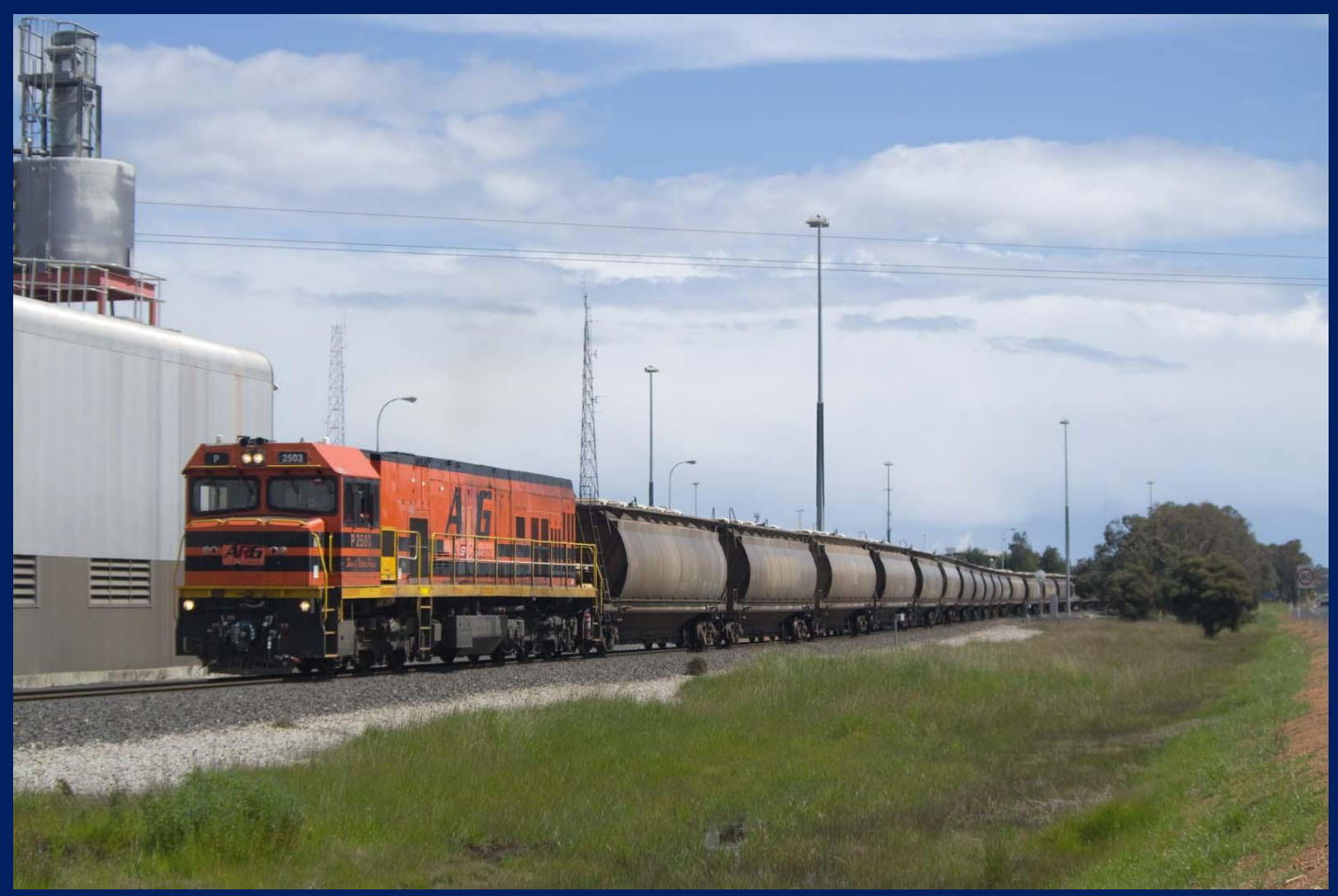
P2503 on 5874 empty Worsley alumina at Picton September 29th.