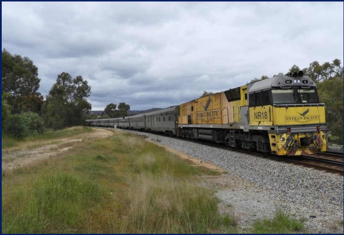
NR18 on 5AP8 Indian Pacific running wrong line at Bellevue October 7th.