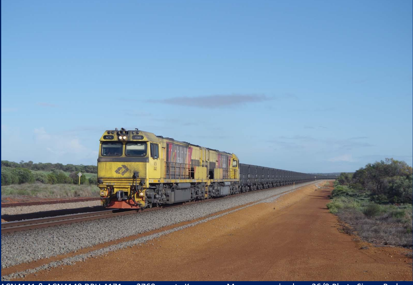
ACN4141 & ACN4148 DPU 4171 on 3760 empty Karara ore Monger crossing loop 26/9.