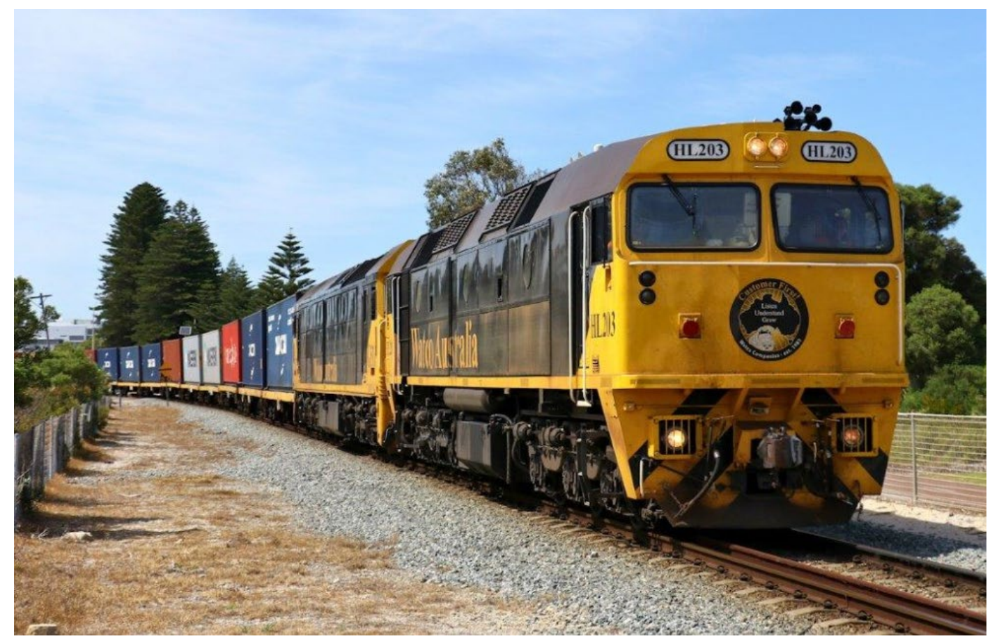
HL203 & G511 with a loaded container train at South Fremantle, 3^{rd} December.