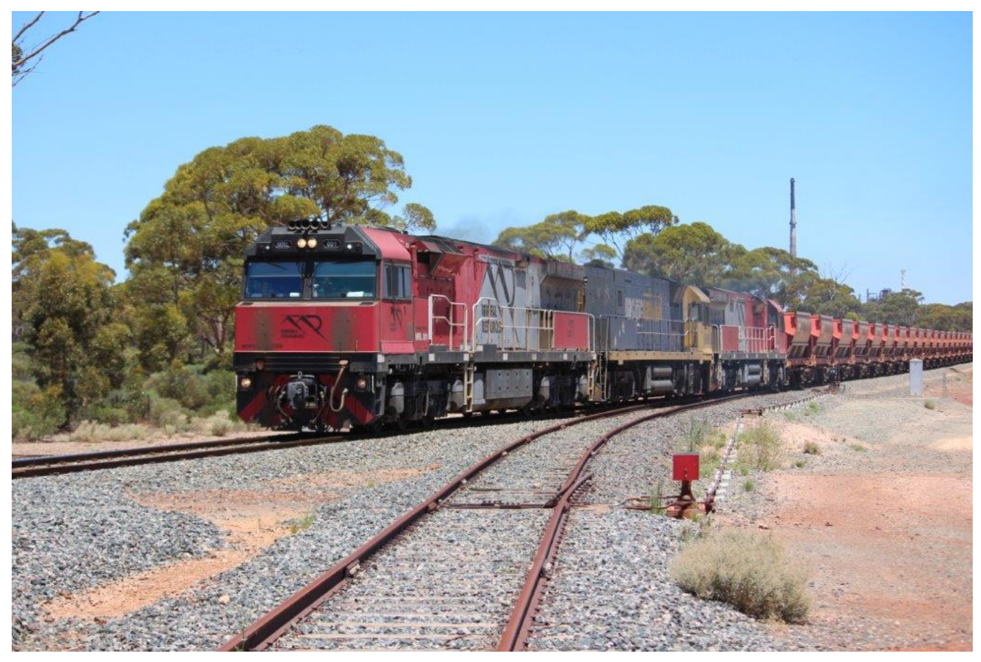
MRL001, NR80 & MRL002 smoke away from Hampton with 1030 ore, 16<sup>th</sup> December.