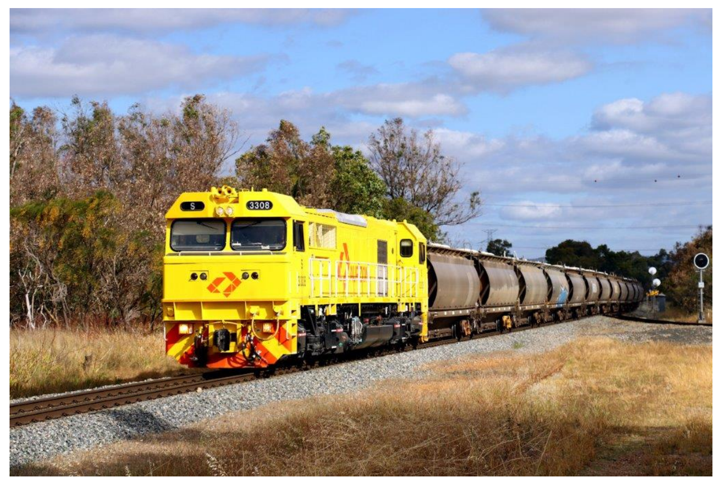
S3308 shows the new corporate colours on 7224 loaded alumina, Pinjarra East, 1<sup>st</sup> December.