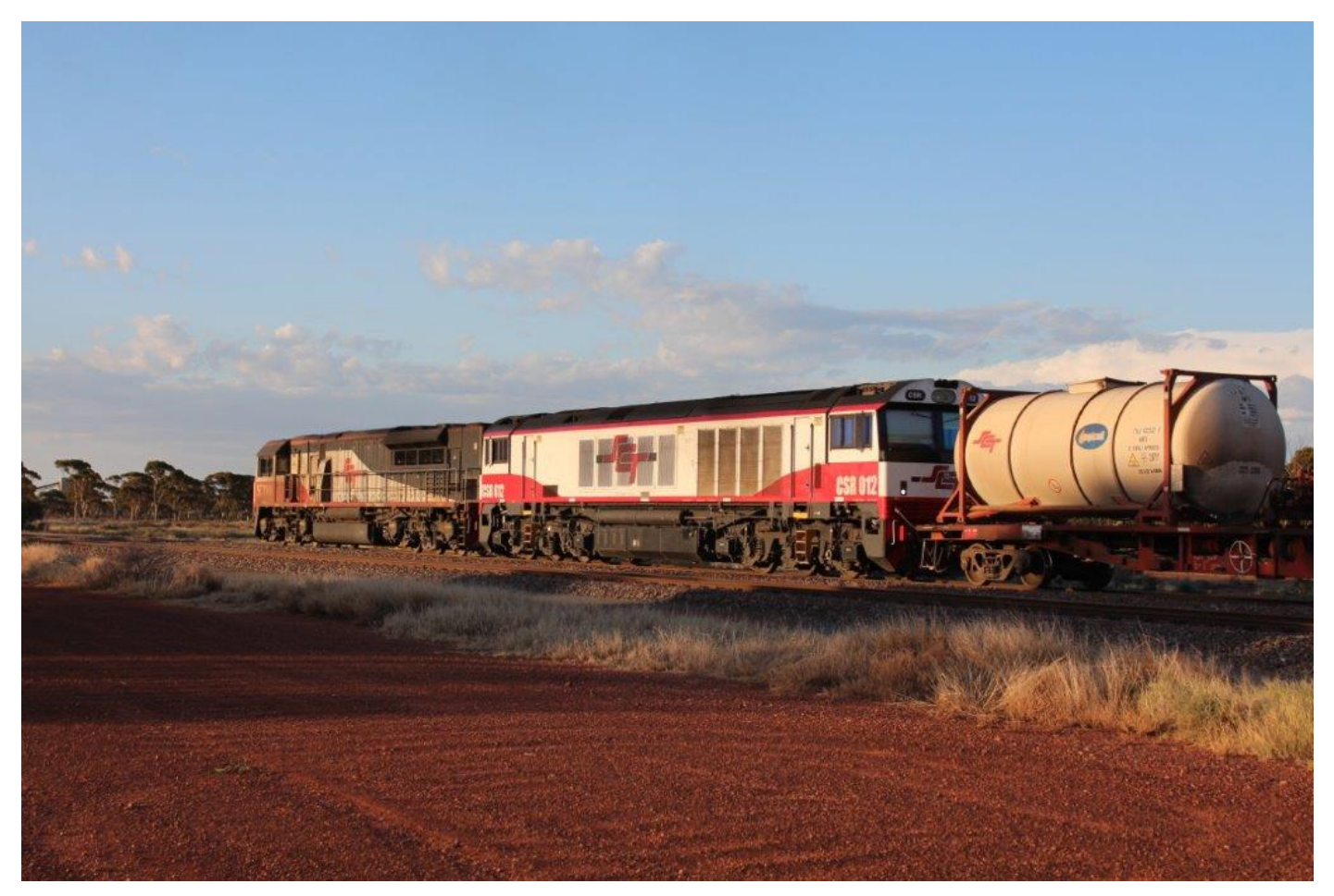
The setting sun catches SCT006 & CSR012 on late-running 1MP9, 11<sup>th</sup> December.