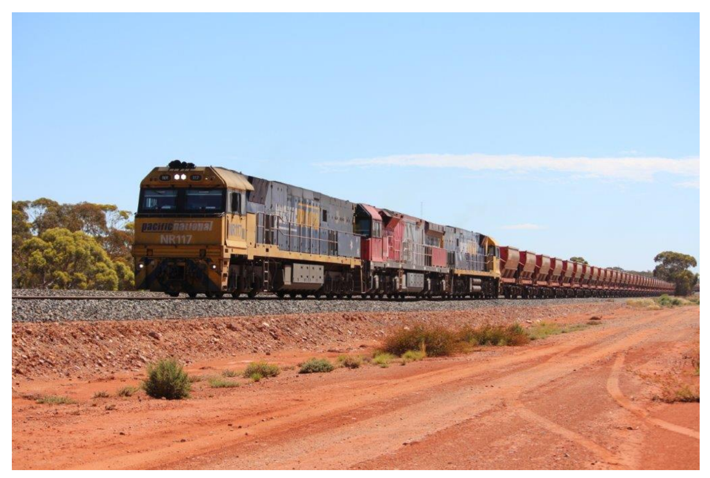
NR117, MRL006 & NR94 ease 7032 empty ore around the west leg of Binduli triangle (above), and changing crews (below), 15<sup>th</sup> December.