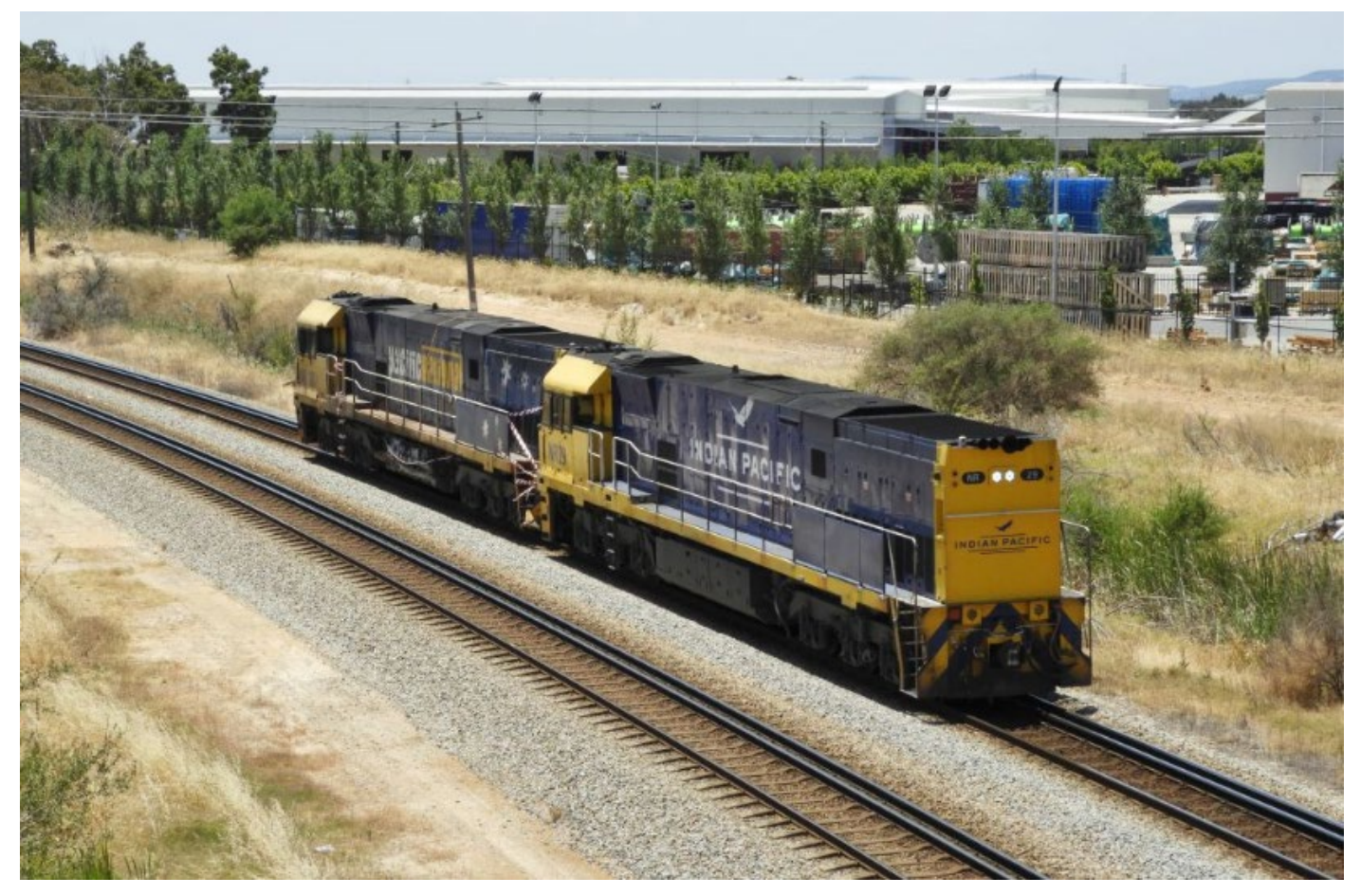
NR29 hauls Coonana derailment-damaged NR120 from temporary repairs at UGL Bassendean as 3P24 to Kewdale, to forward east for further repairs, South Guildford, 3<sup>rd</sup> December.