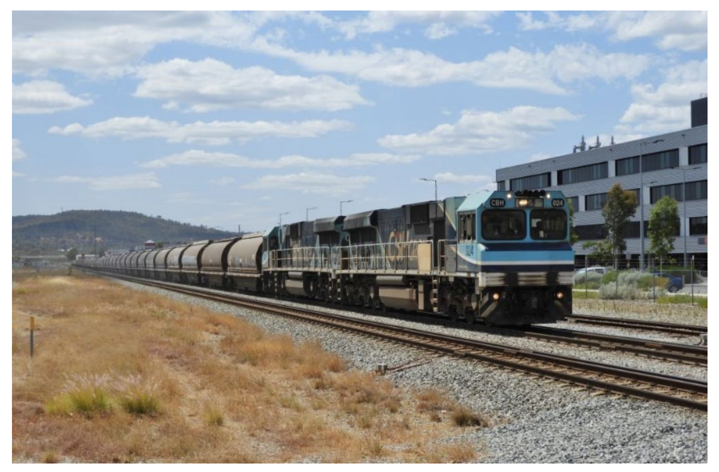
1K46 Watco grain at Midland behind CBHs 024 & 023, 16<sup>th</sup> December.