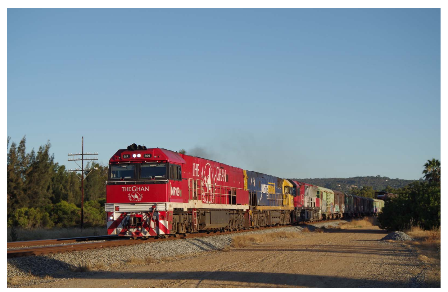
NRs 109 & 2 haul MRL004 from workshops to West Kal on 5PM5, Stratton, 20<sup>th</sup> December.