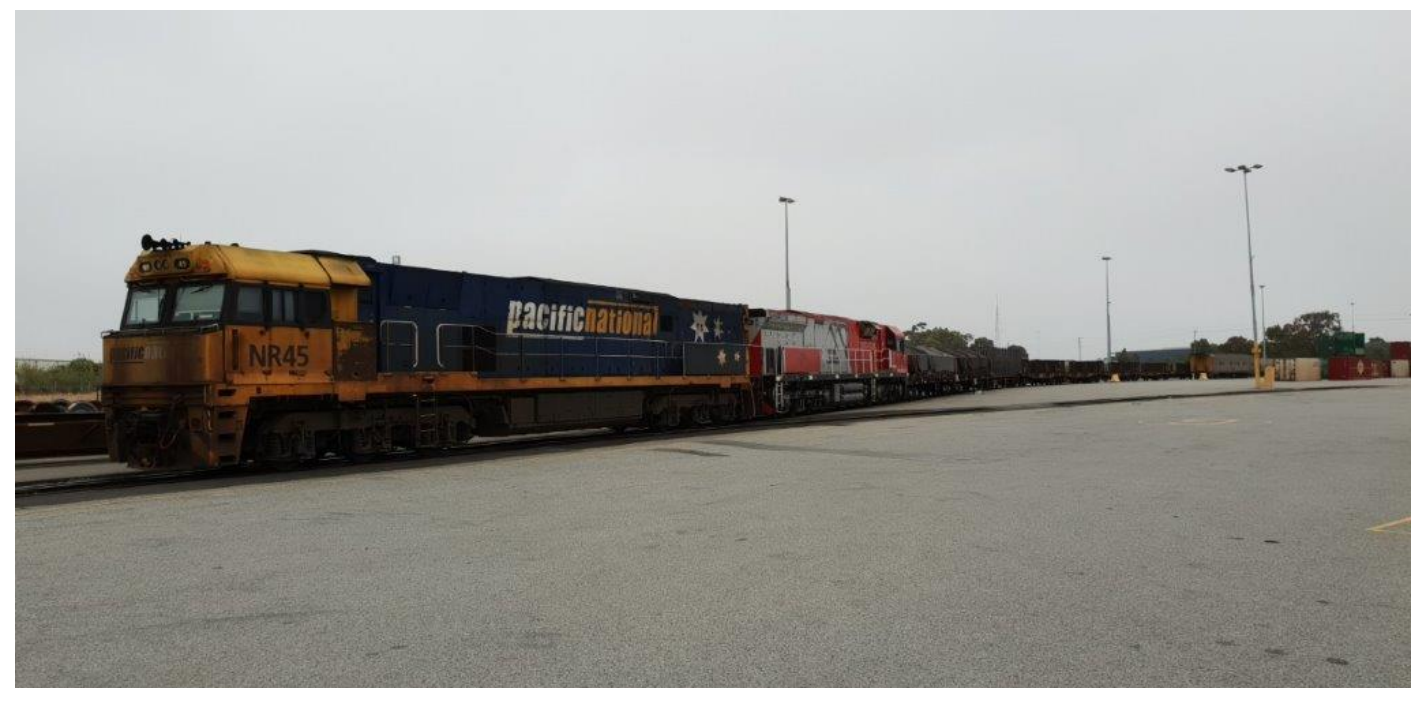
NR45 & MRL005 prepare to depart Kewdale with 7PX4, 17<sup>th</sup> November.