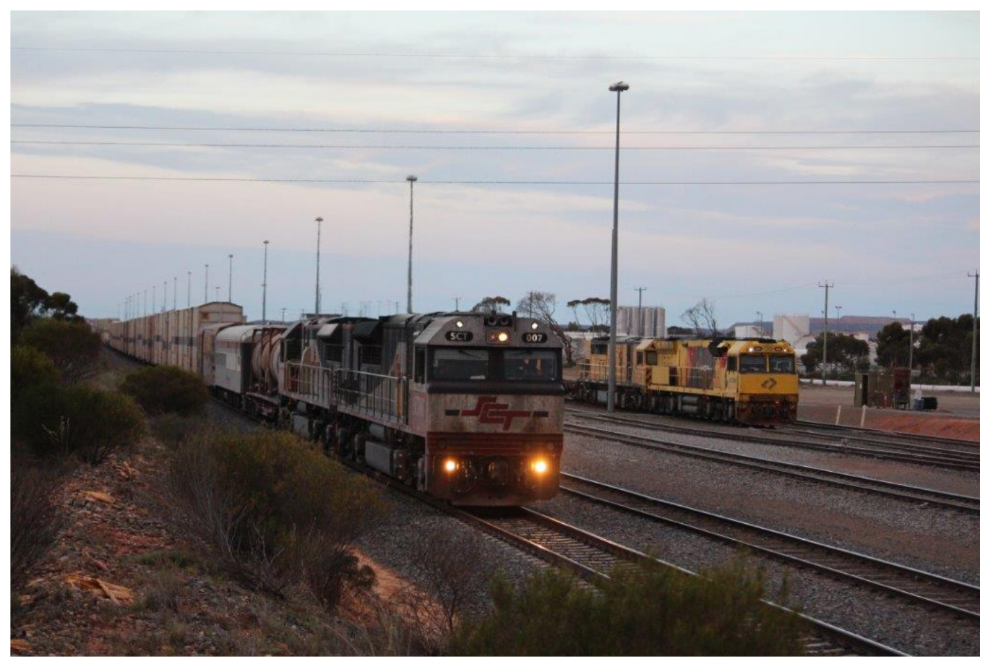
SCTs 007 & 009 on a late 5MP9 pass ACC6030 & Q4017 on 7426 at sunset, West Kalgoorlie, 8<sup>th</sup> December.