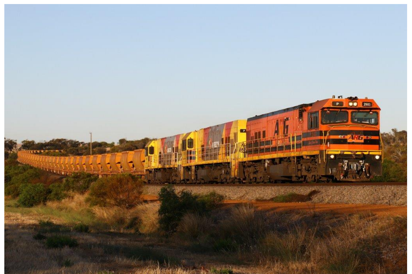
Ps 2503, 2506 & 2505 lead 4725 loaded Mt Gibson ore towards sunset, Moonyoonooka, 12/12. Page 16 of 28