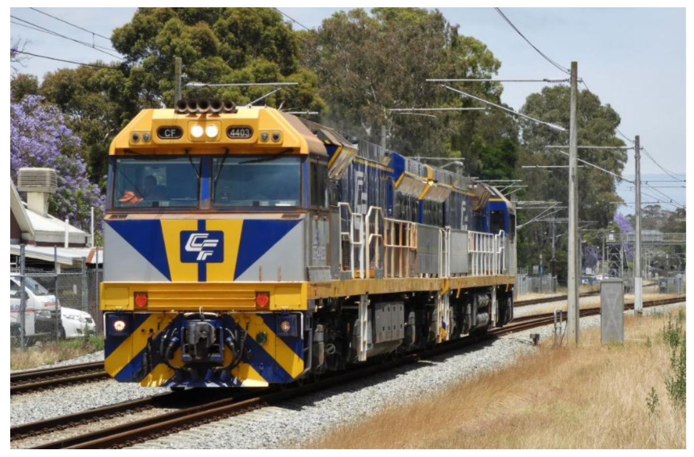
After several years in the Pilbara, CFs 4403 & 4410 were overhauled at UGL Bassendean, then seen here at Guildford as 4110 light engine transfer to SCT Forrestfield for haulage back east, 5<sup>th</sup> December.