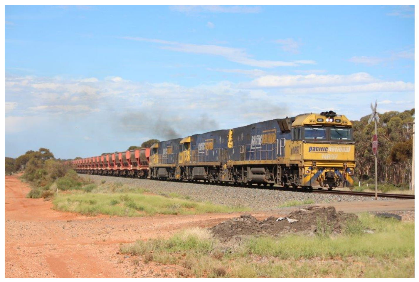
NRs 97, 78 & 117 accelerate away from Binduli on 1030 empty ore, 9<sup>th</sup> December.