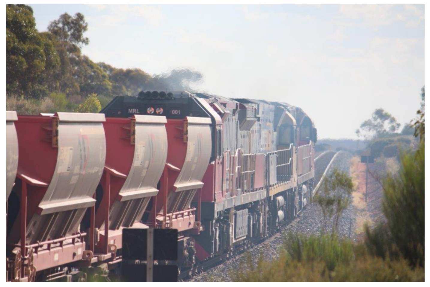
3030 empty ore smokes up the grade out of Binduli, 11<sup>th</sup> December.