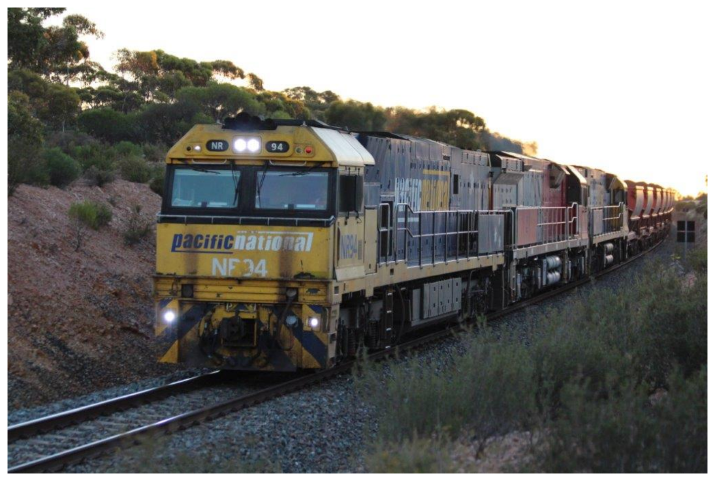
NR94, MRL006 & NR117 roll 5033 downhill towards Binduli at sunset, 20<sup>th</sup> December. P