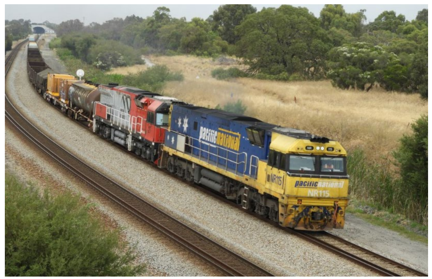
NR115 transfers MRL003 to West Kal for ore duties on 7PX4, South Guildford, 15<sup>th</sup> December.