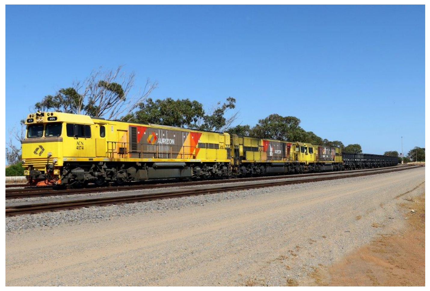
ACNs 4174, 4146 & 4151 at Narngulu with 6762 empty Karara ore, 14<sup>th</sup> December.