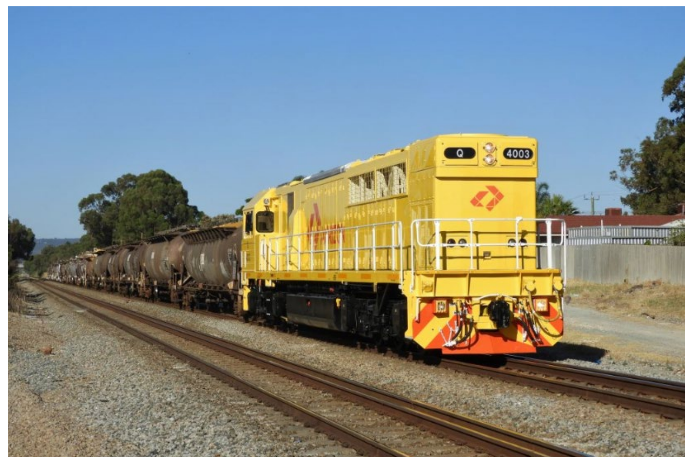
Freshly repainted Q4003 works 4158 fuel shunt from Forrestfield to Kwinana, Thornlie, 21/12.