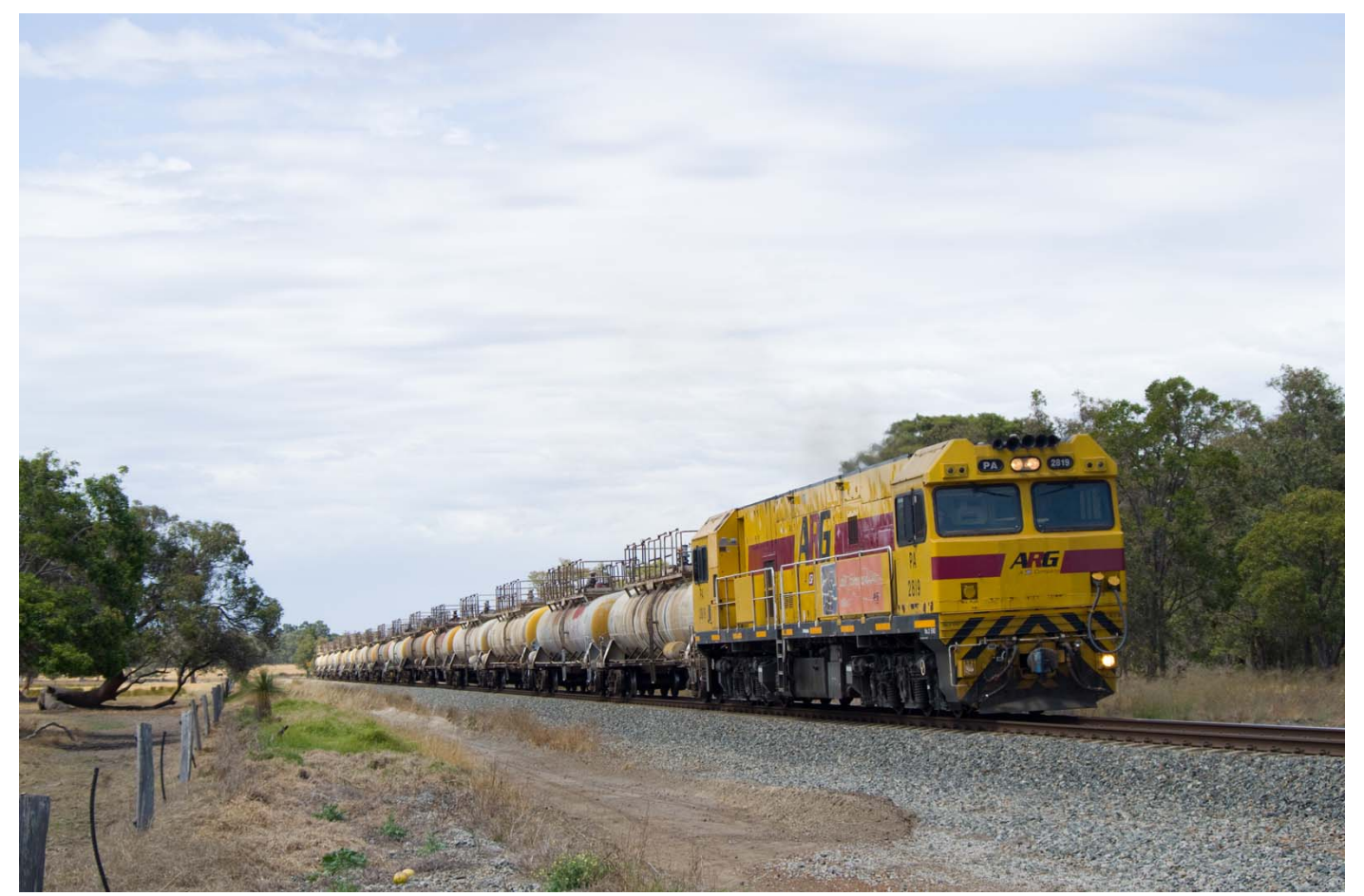
PA2819 works 1238 through Keysbrook, 16<sup>th</sup> December.