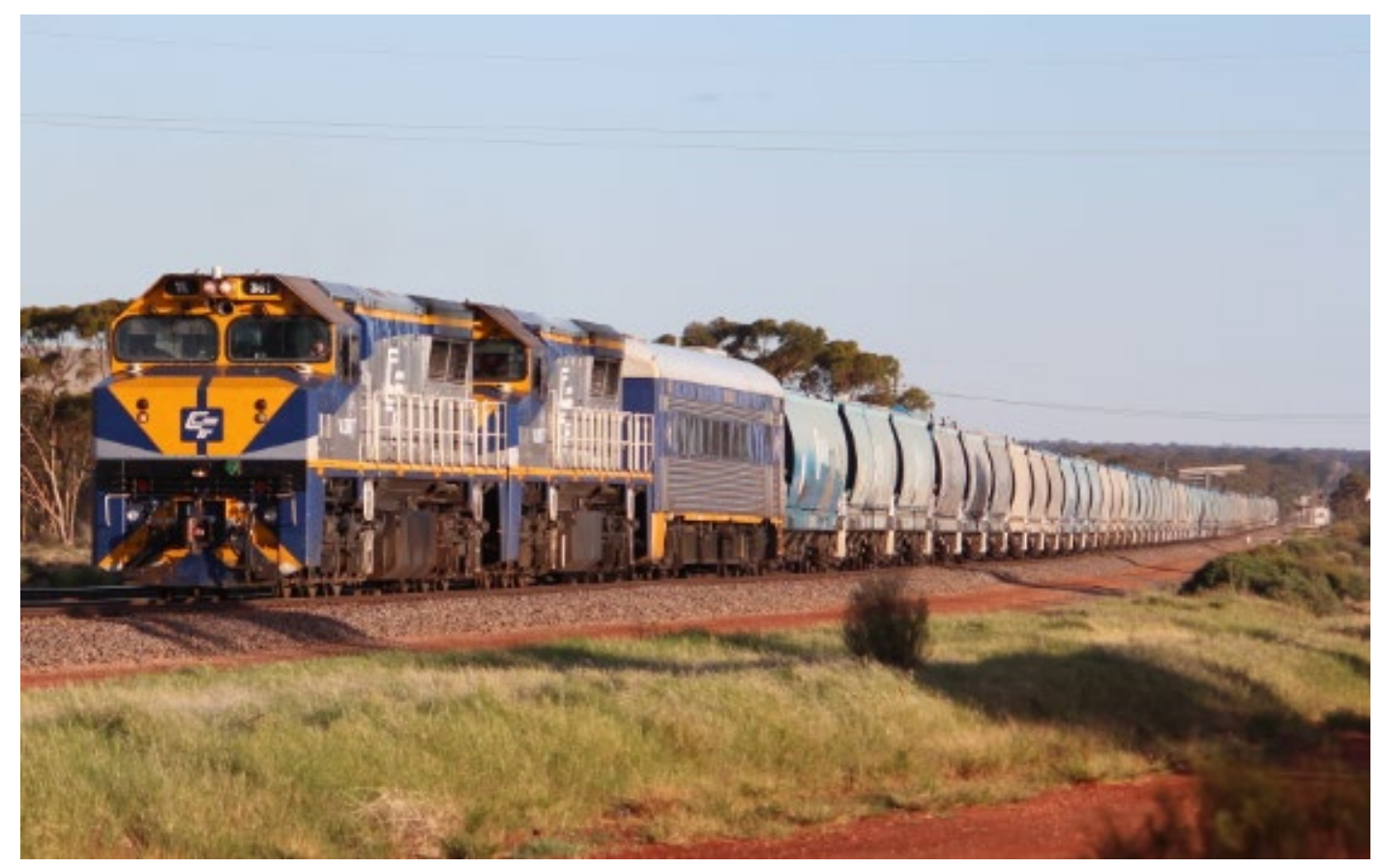
2AP1 rolls along the main at Parkeston, 18<sup>th</sup> December.