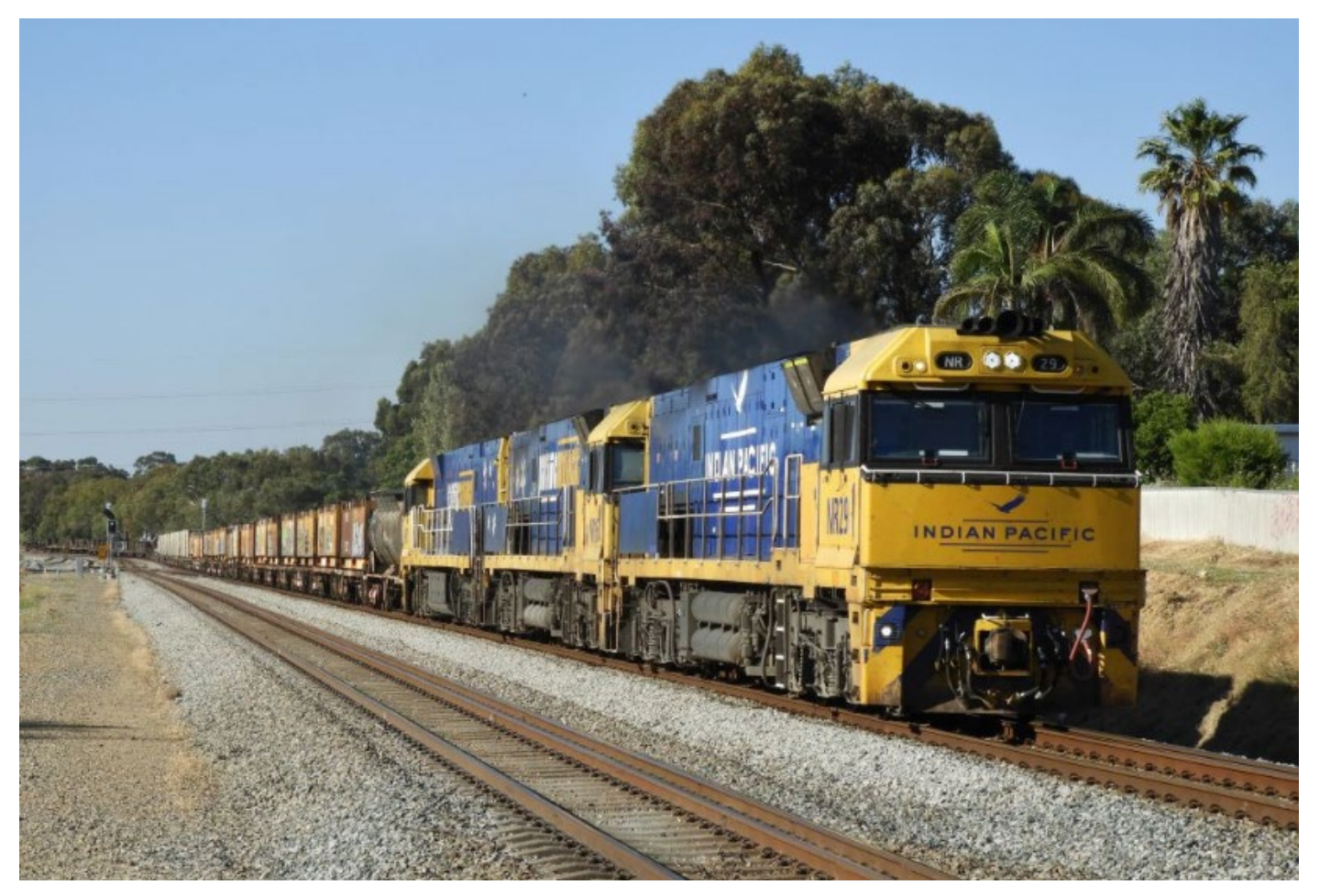
NRs 29, 16 & 15 work through Hazelmere on 5MP2, 2<sup>nd</sup> December.