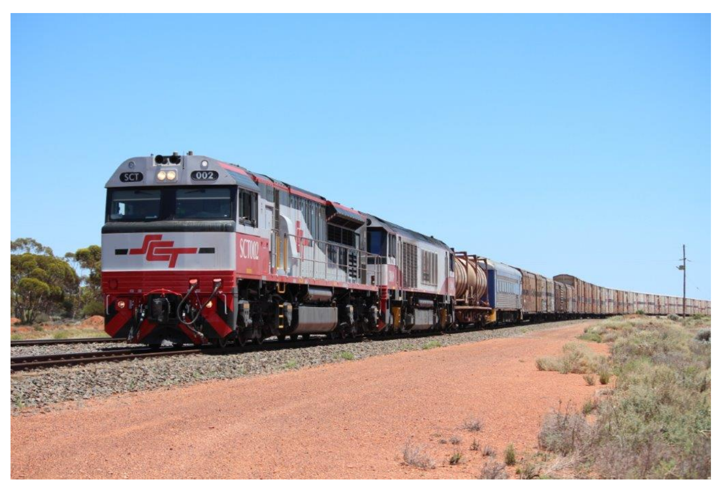
Fresh SCT002 leads CSR009 on 1PA9, 16<sup>th</sup> December.