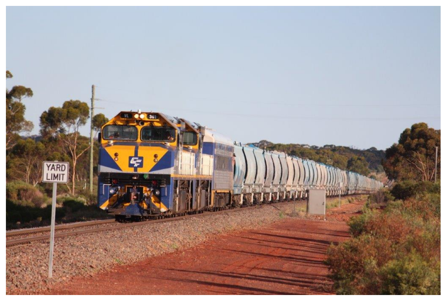
VLs 361 & 357 with a rake of 66 NGXH hoppers as 2AP1 on delivery from NSW waits outside Parkeston for C74 shuttle to clear, 18<sup>th</sup> December.