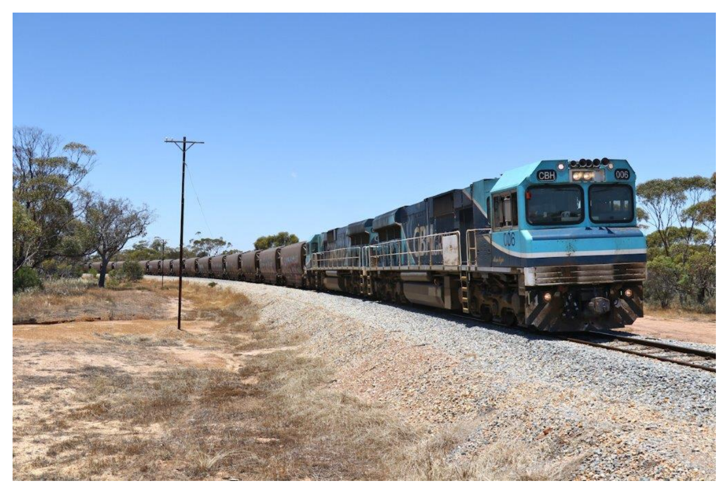
CBHs 006 & 025 on an empty grain through Watheroo, 1<sup>st</sup> December.