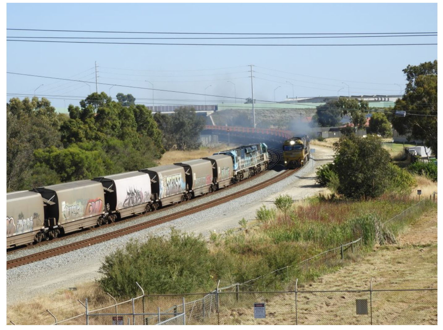
CBHs 025 & 006 on 1K53 empty grain cross smoky NR97 & NR78 on 1038 empty ore hoppers from Forrestfield to Kwinana to clear the remaining iron ore stockpile, Wattle Grove, 2<sup>nd</sup> December. Page 6 of 28