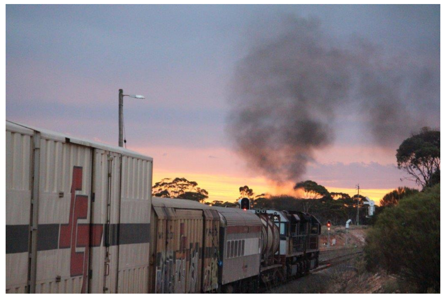
SCTs 007 & 009 smoke as they depart West Kalgoorlie into the sunset, 8<sup>th</sup> December. Page 12 of 28