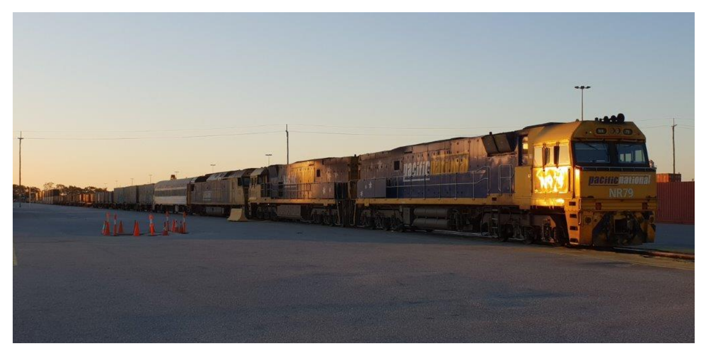
NRs 79 & 91 plus AN2 on 4PM6, Kewdale, 28<sup>th</sup> November.