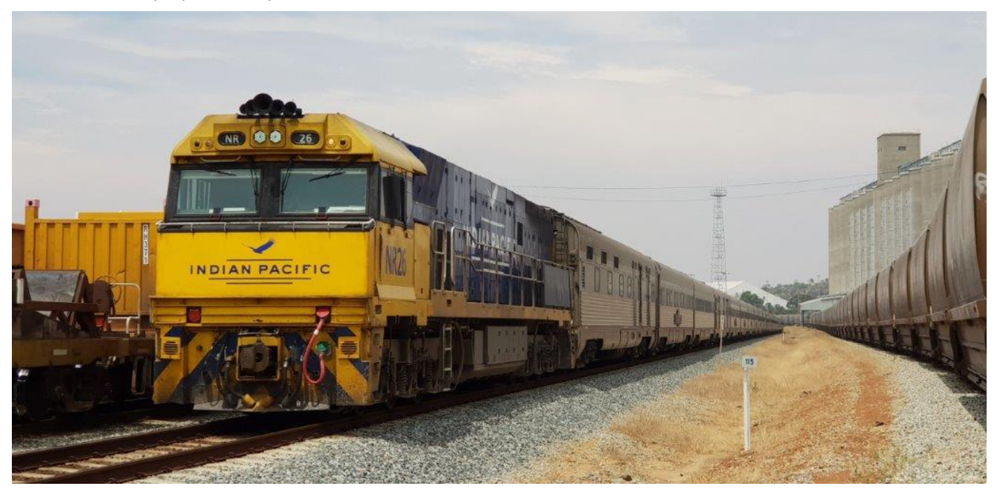
5AP8 Indian Pacific runs through Avon Yard behind NR26, 17<sup>th</sup> November.