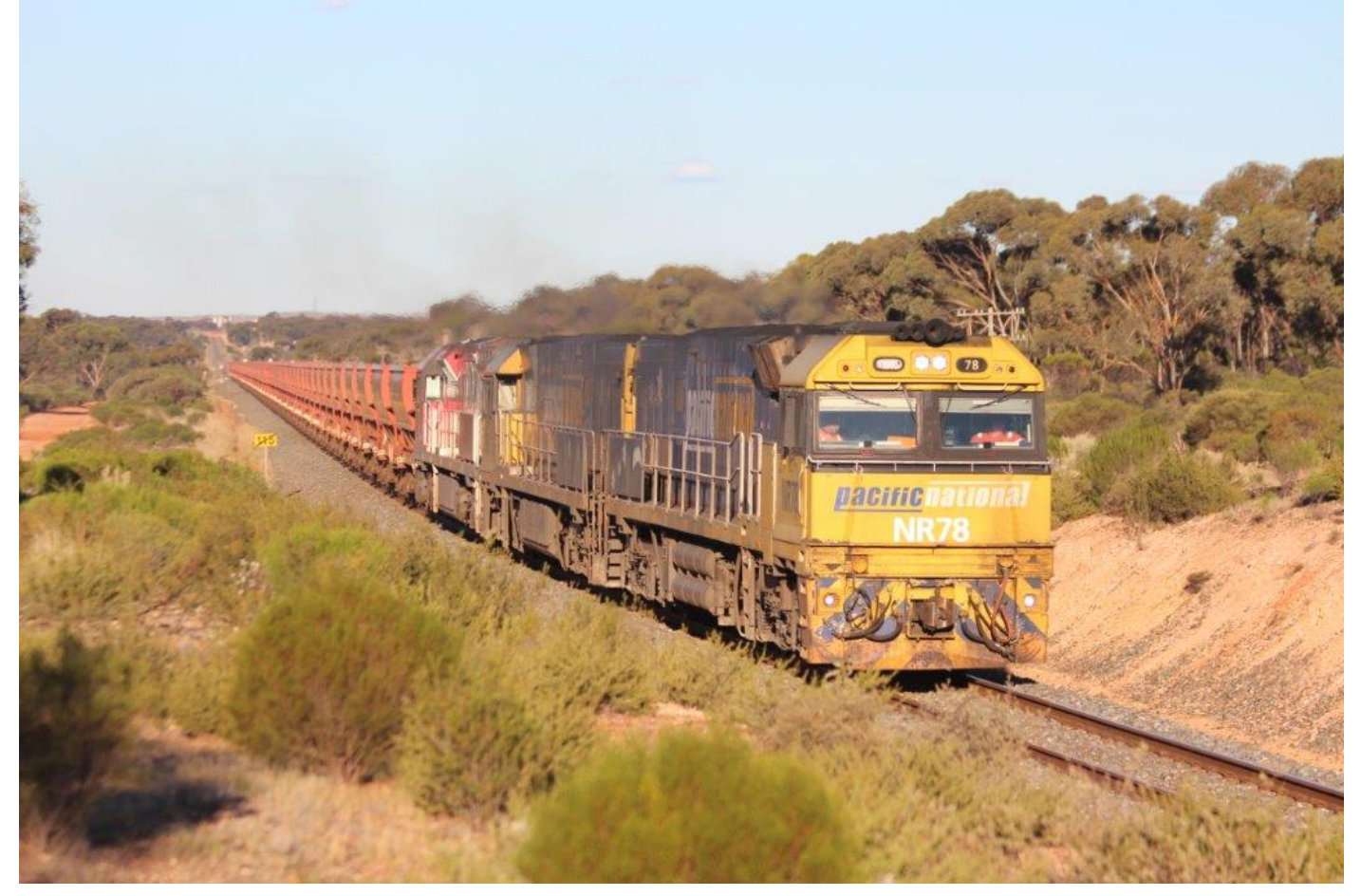
NRs 78 & 97 lead MRL003 on 5030 empty ore upgrade away from Binduli, 20/12. Page 27 of 28