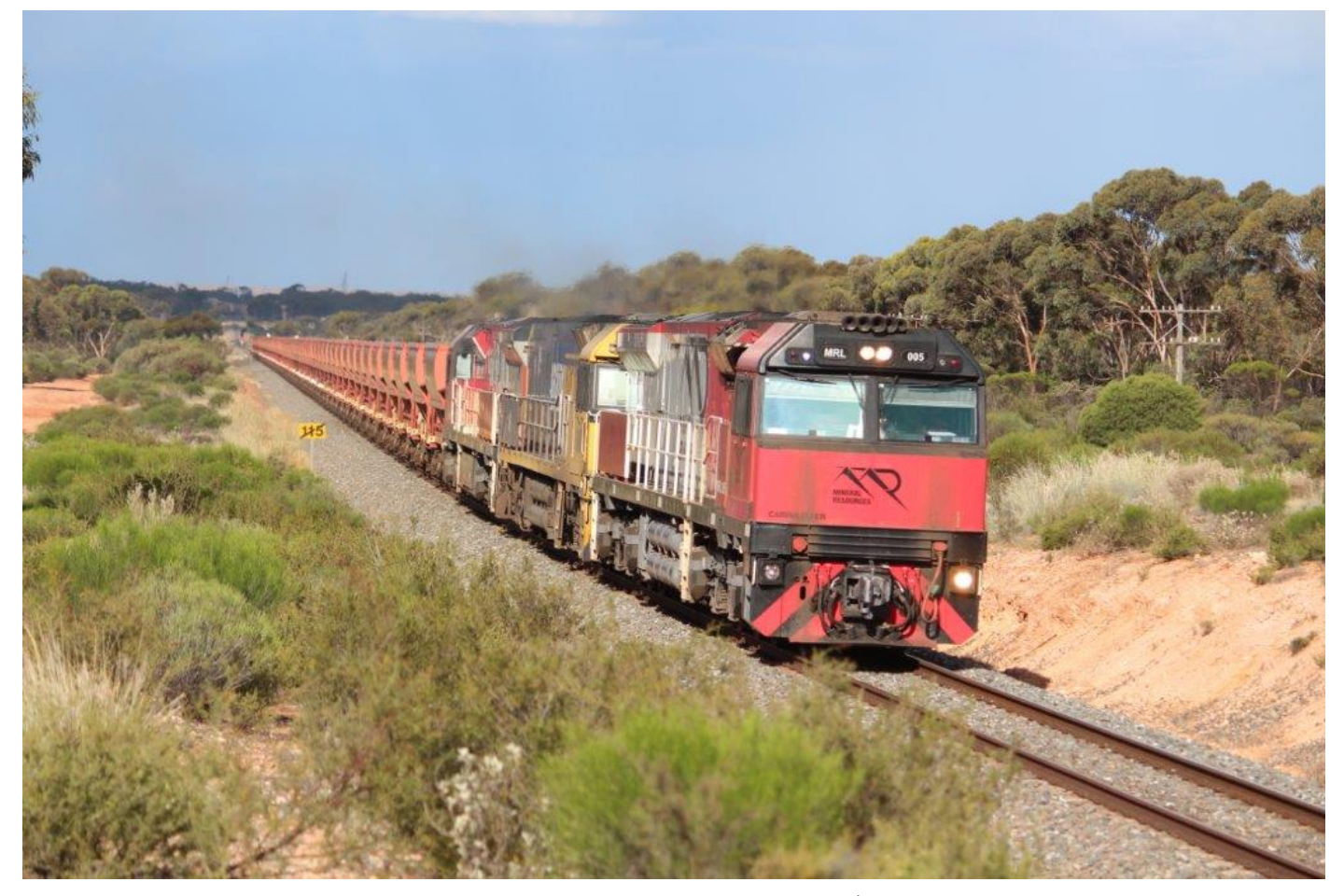
MRL005, NR64 & MRL001 work 3030 empty ore upgrade out of Binduli, 11<sup>th</sup> December. Page 14 of 28