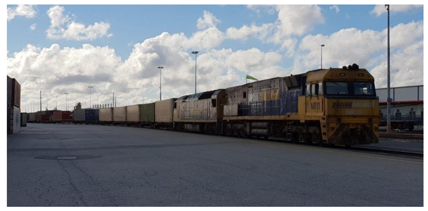
NR11 & AN2 shunt the rear portion of 6SP5, Kewdale, 18<sup>th</sup> November.