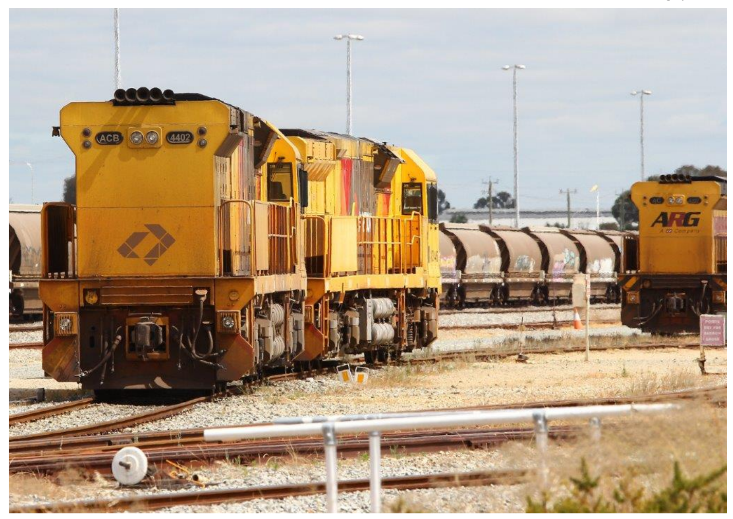
ACBs 4402 & 4405 with AC4307, Forrestfield, 1<sup>st</sup> December.