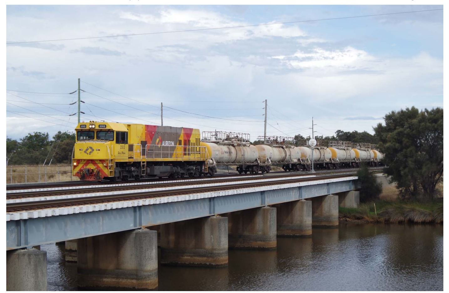
2512 works 1854 through Harbour Junction, 16<sup>th</sup> December.