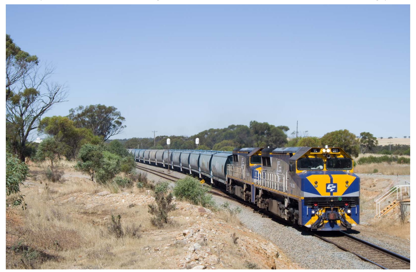
VLs 361 & 357 haul 4S72 away from Meckering, 19<sup>th</sup> December.