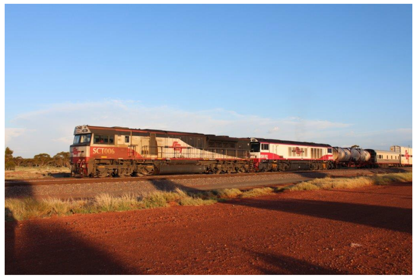
CSR012 makes its maiden voyage to WA behind SCT006 on Christmas extra service 1MP9, Parkeston, 11/12. Page 15 of 28