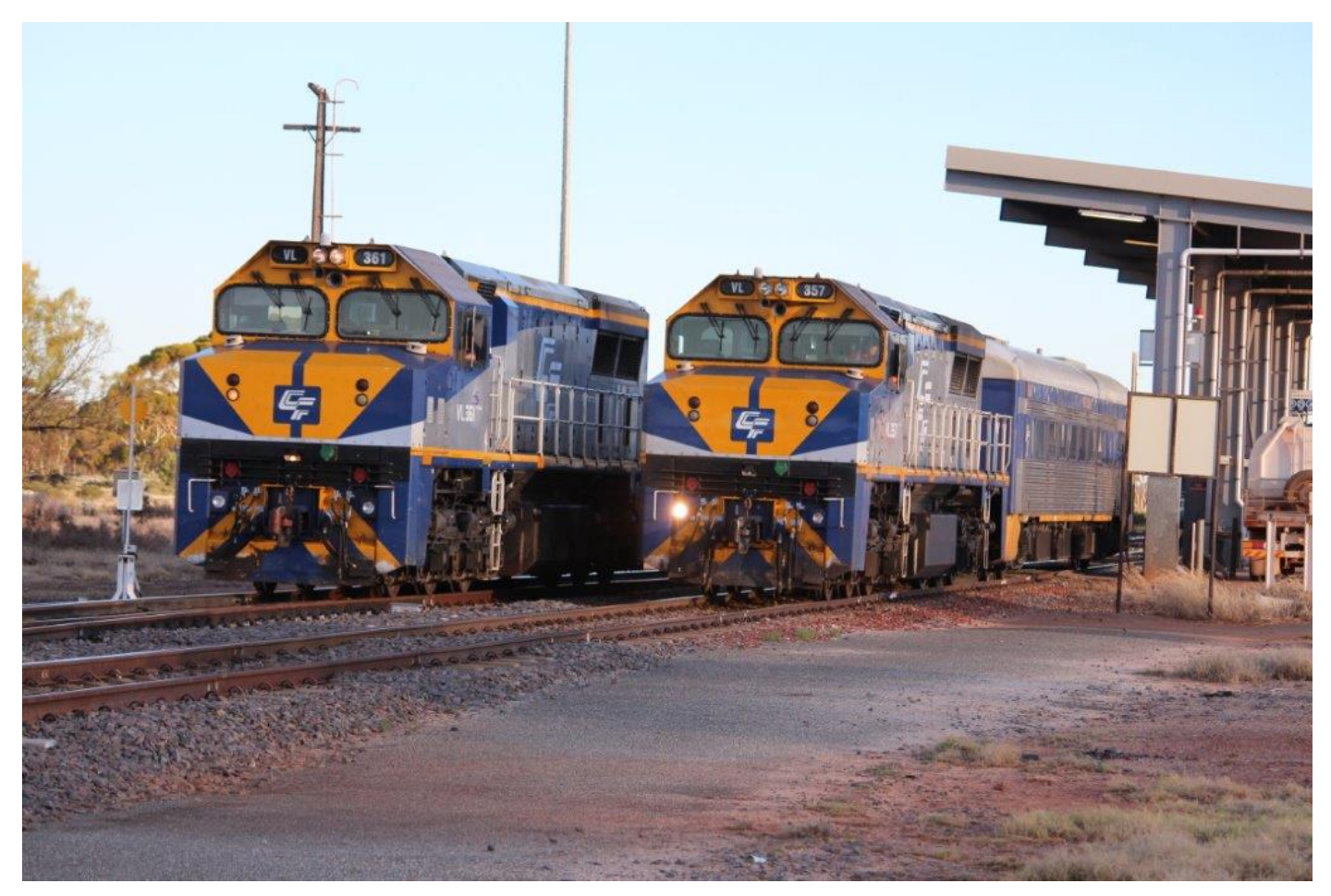
VLs side by side at Parkeston while removing the coach off, 18^{th} December.