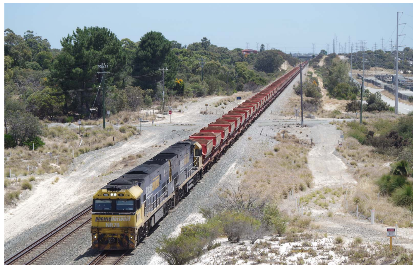
2039 ore from Kwinana to Esperance passes through Jandakot behind NRs 78 & 97, 3/12.