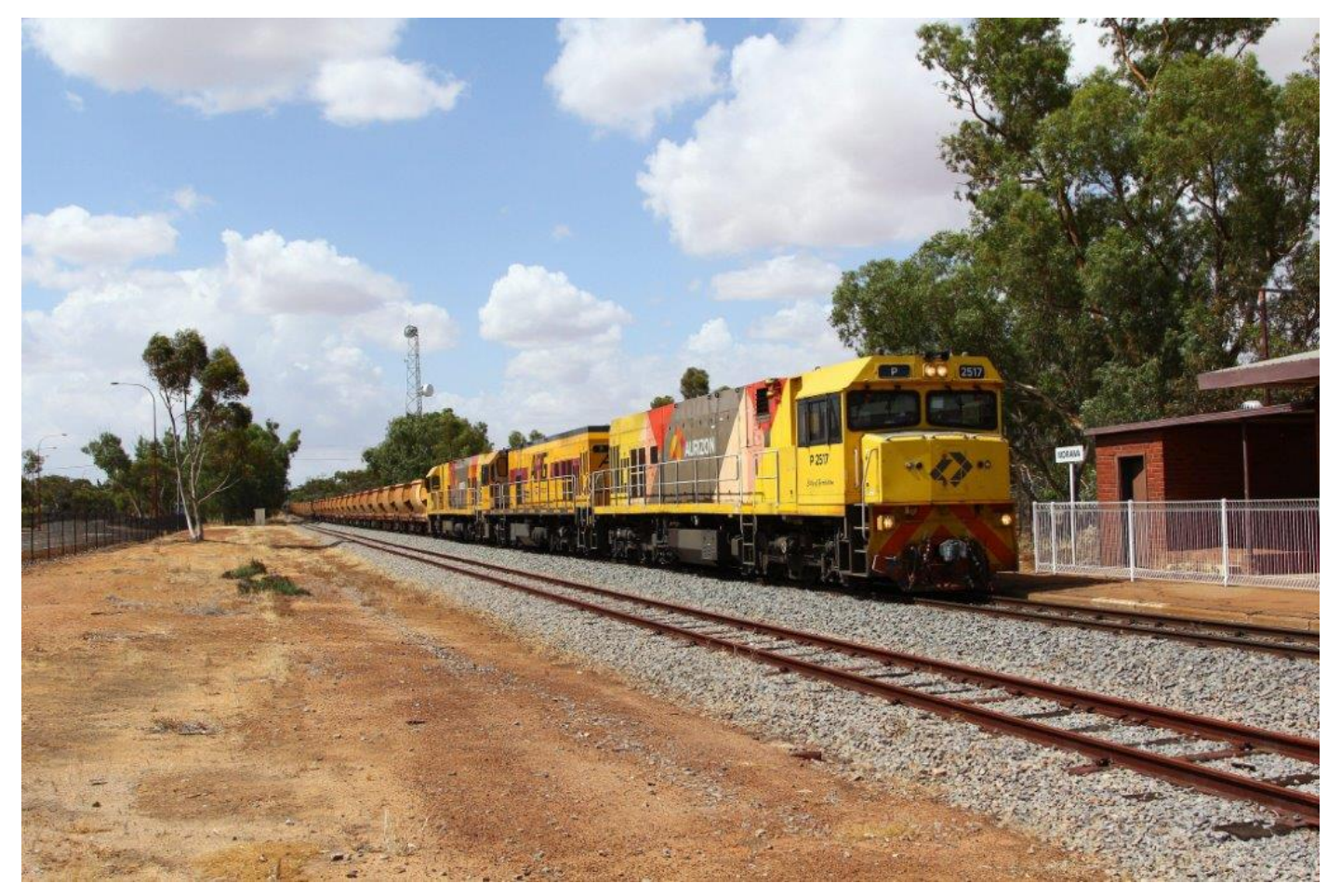
Ps 2517, 2501 & 2507 on 720 empty Mt Gibson ore at Morawa, 16<sup>th</sup> December.