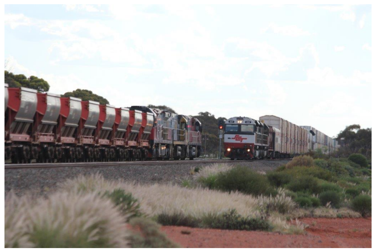
A late 2PM9 with SCTs 014 & 015 crosses MRL005, NR64 & MRL001 on 3030 empty ore, Binduli, 11<sup>th</sup> December.