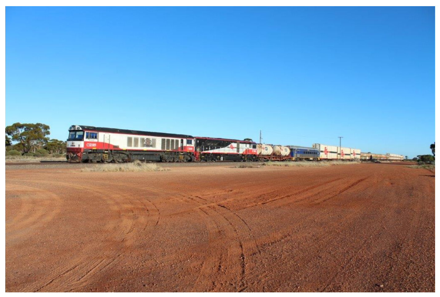
CSR009 leads fresh overhaul/repaint SCT002 on Christmas extra 5AP9, Parkeston, 14/12.