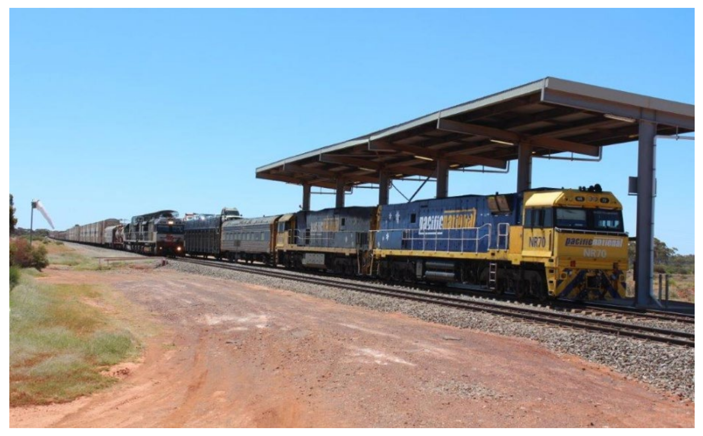
SCTs 011 & 005 on 6PM9 arrive beside NRs 70 & 87 on 6PM6, Parkeston, 1<sup>st</sup> December.