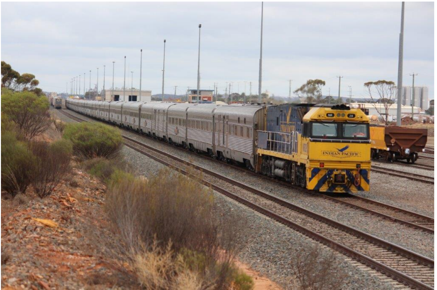
Re-pathed Indian Pacific arrives at West Kal as 6PM7 departs, 18 th January.