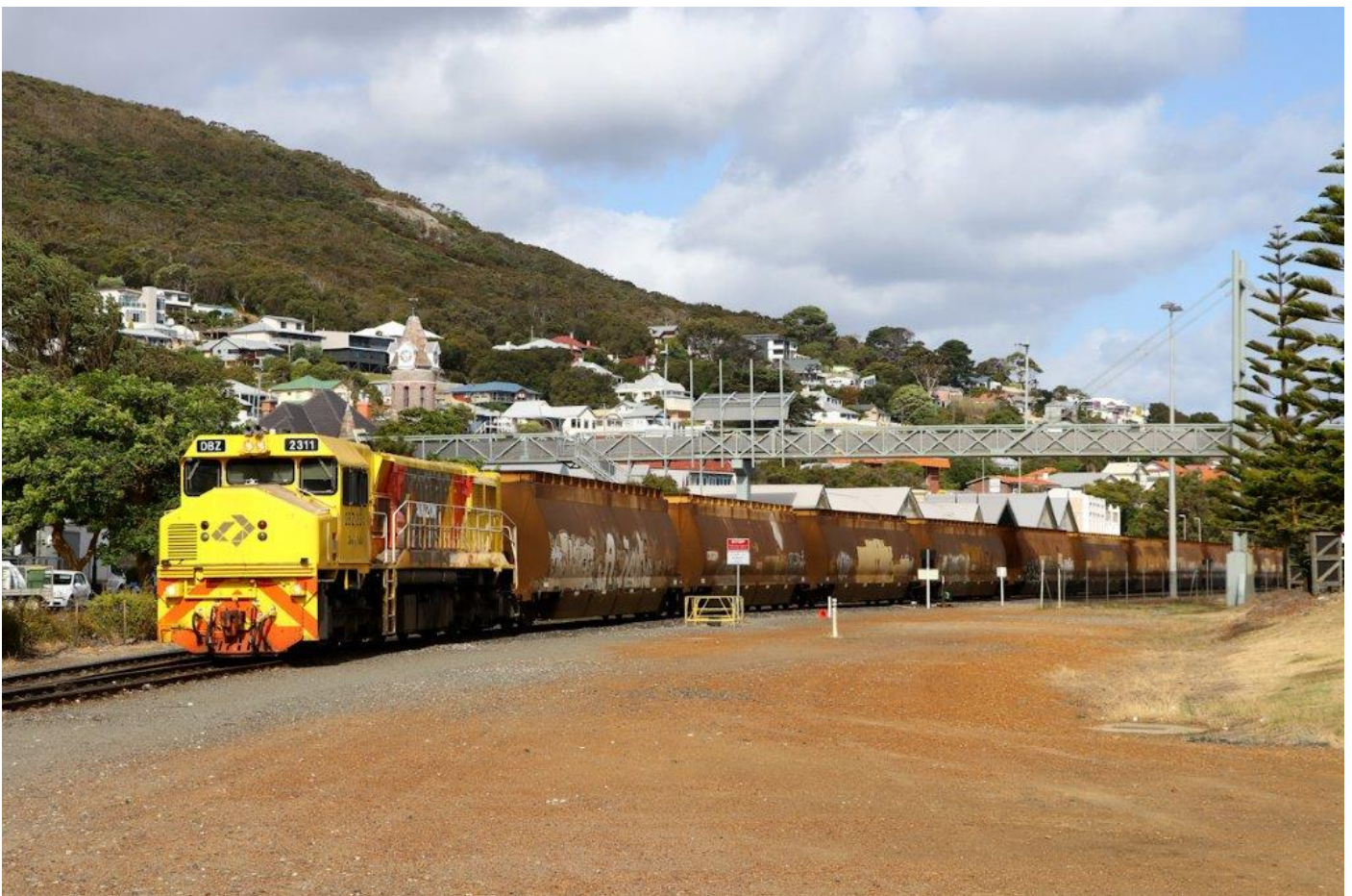
DBZ2311 departs Albany on 5606 empty woodchip rake, 9 th January.