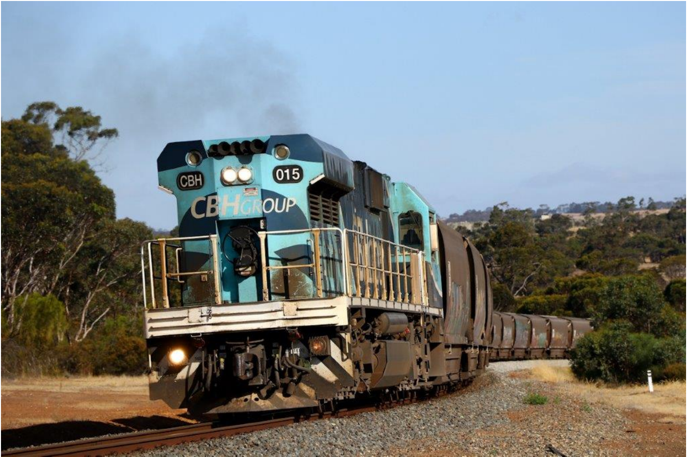
CBH015 heads an empty grain near Carbarup, 8 th January.