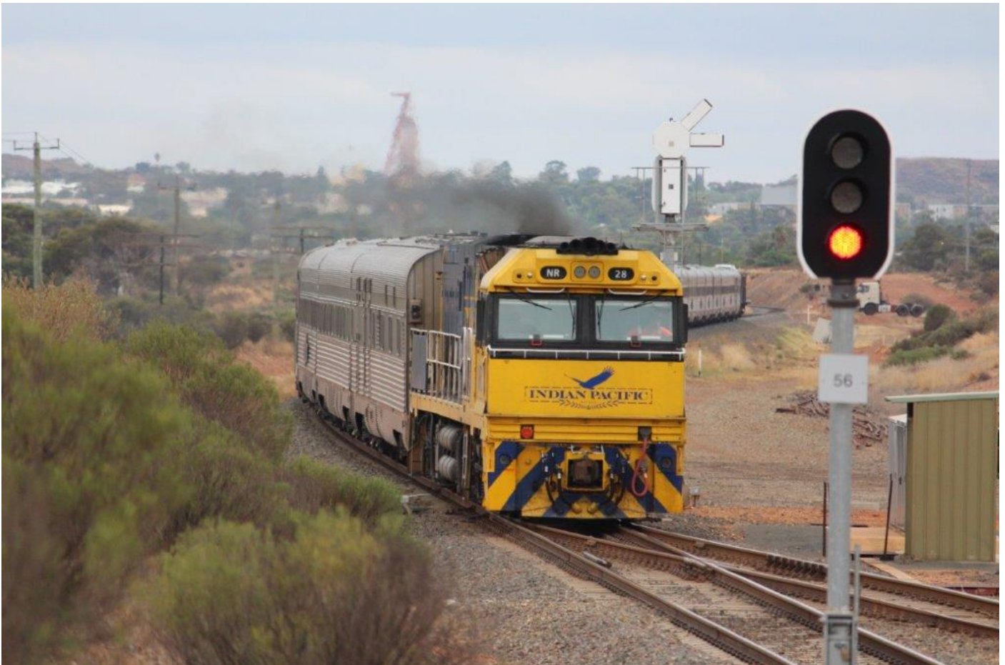
Running 8 hours late and as 6AP8, NR28 leads the IP into West Kal, 18 th January.