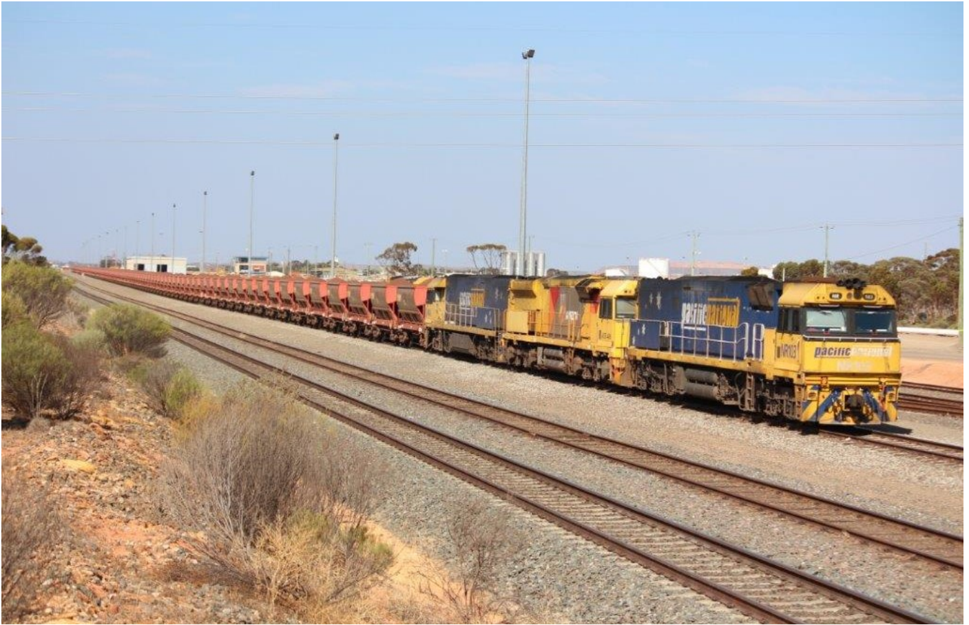
NR103, ACB4406 & NR46 stabled at West Kalgoorlie, 2 nd January. This had been train 1033 four days earlier, parked at Kambalda due to bushfires before returning north as 4032 to await line reopening.