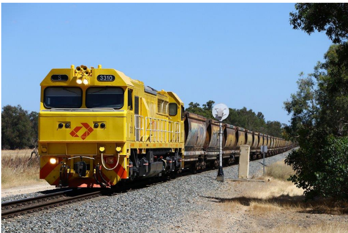
3964 empty bauxite is led through Pinjarra East by S3310, 7 th January.