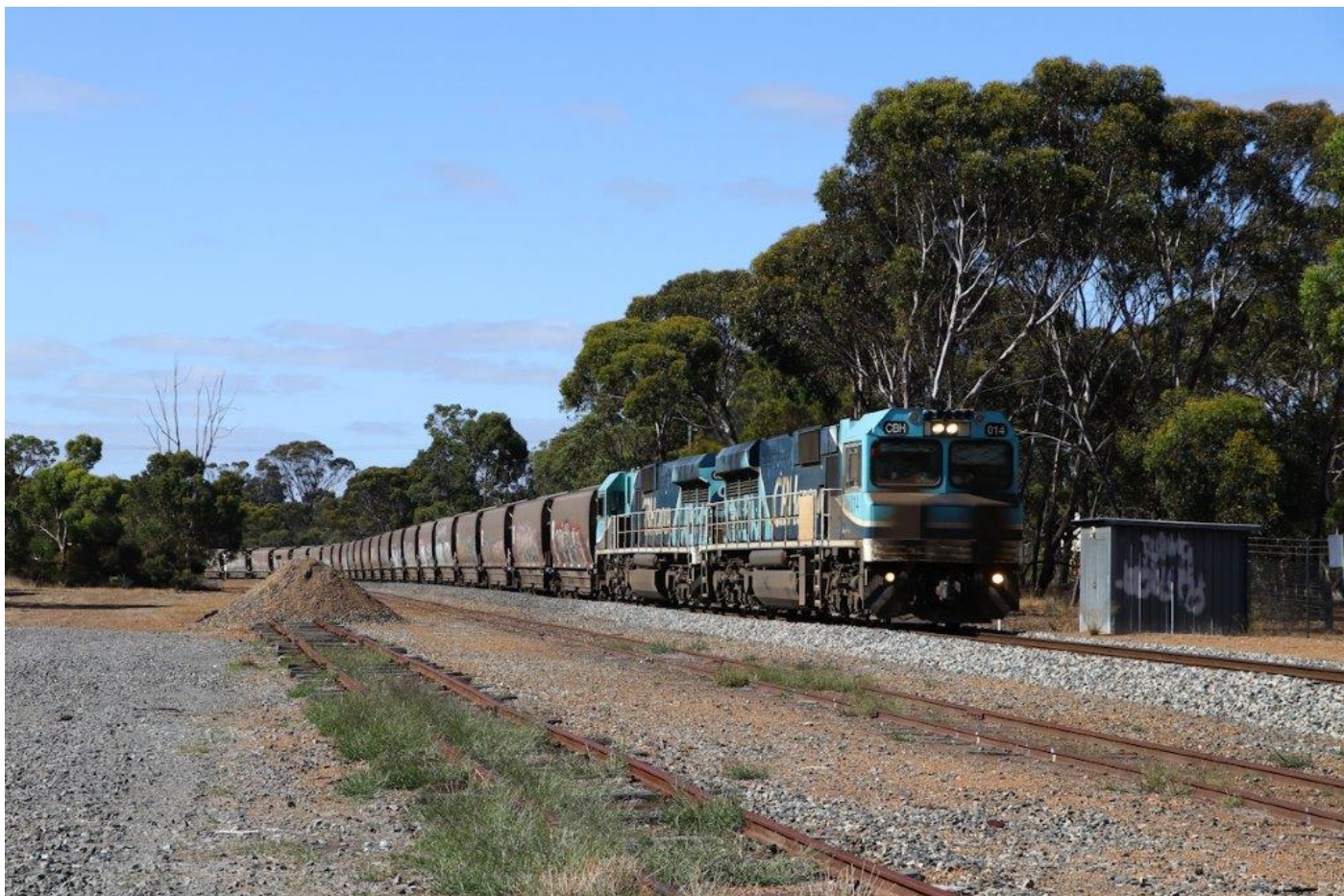
6A82 to Lake Grace rolls through Kendenup behind CBHs 014 & 017, 10 th January.