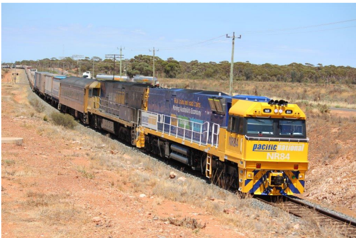
NRs 84 & 87 depart West Kalgoorlie on 6PM7, 4 th January.