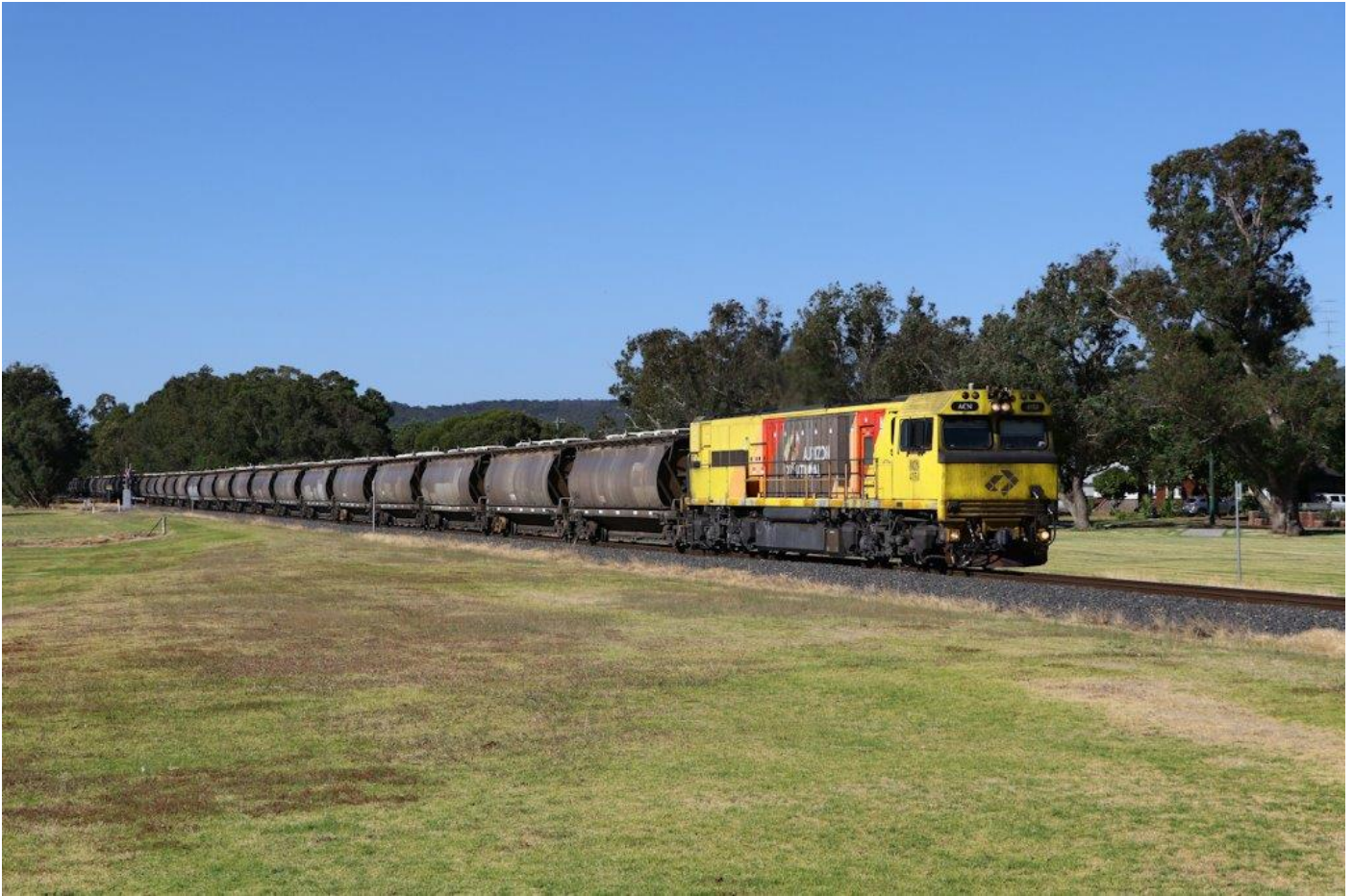
ACN4150 hauls 2875 loaded alumina through Harvey, 6 th January.