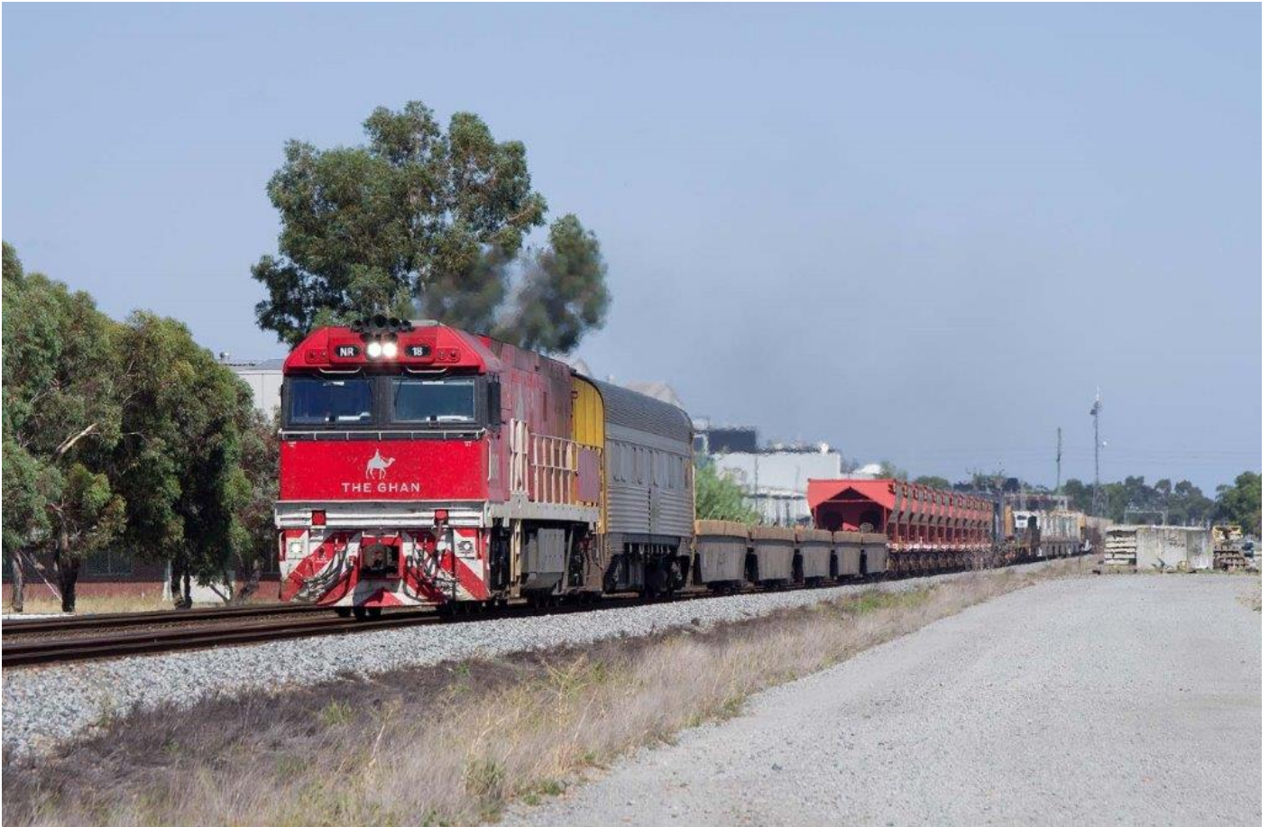
NR18 leads 7PX4 (including intermodal and MHPY hoppers) through Bellevue, 18 th January.