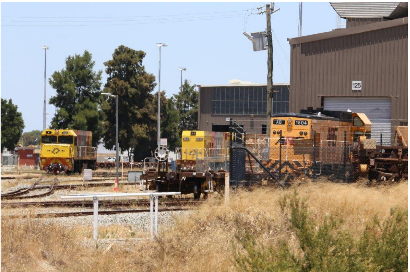
Ps 2505 & 2512 join AB1504 at Forrestfield, 18 th January.