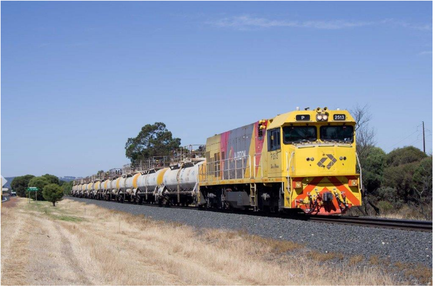
P2513 leads 2854 empty caustic train through Picton Junction, 6 th January.