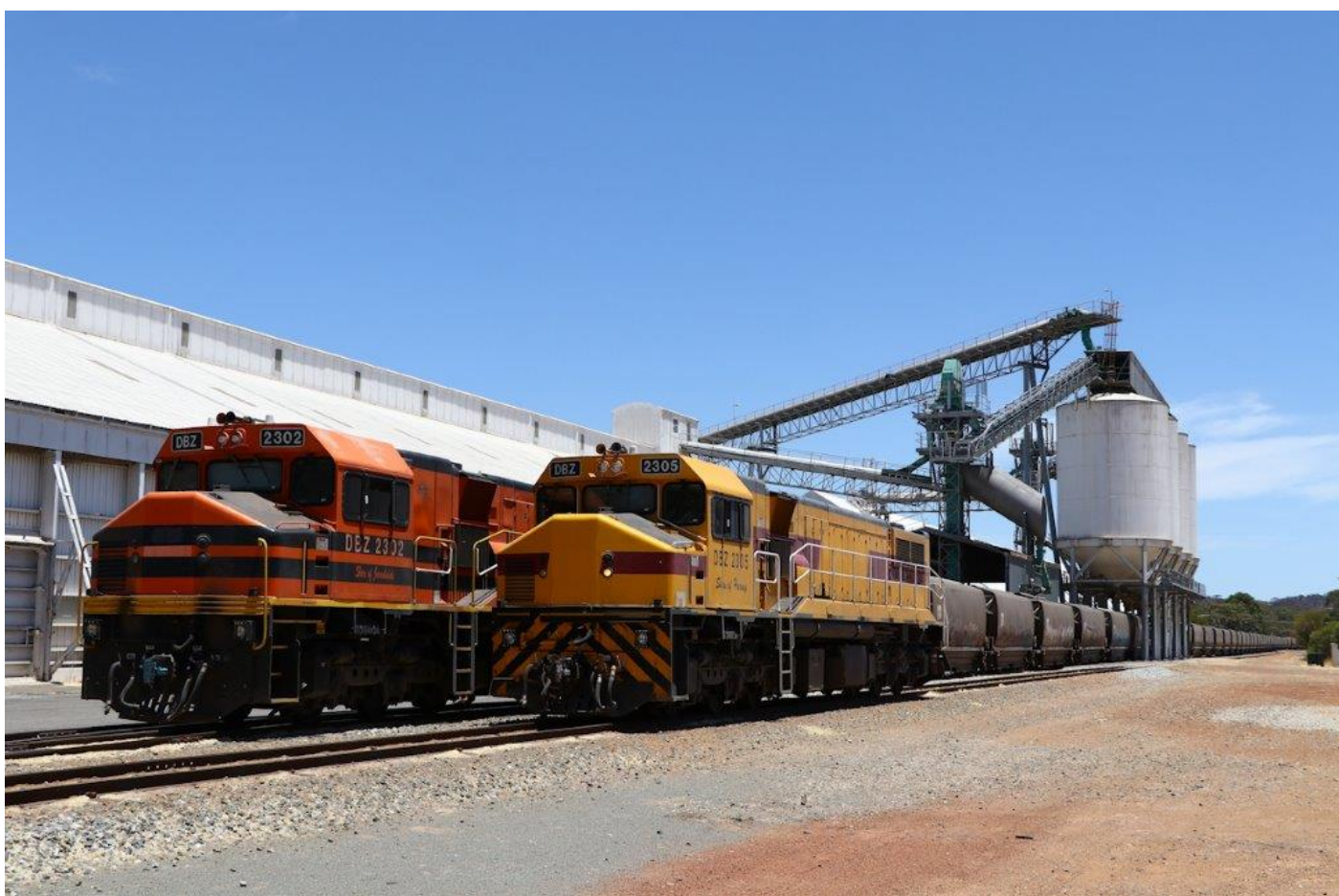
DBZs 2302 & 2305 at Brookton CBH with 1K03/1K04, 5 th January.