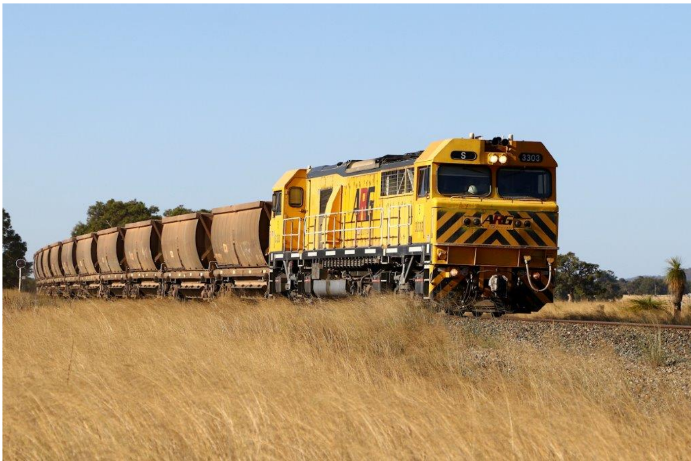
6975 empty bauxite rattles through North Dandalup behind S3303, 10 th January.