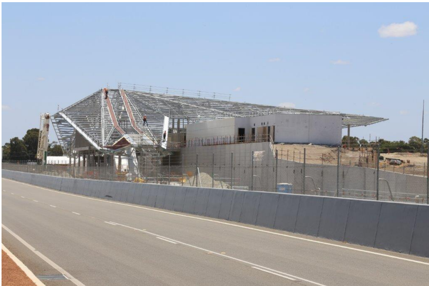
Forrestfield's new station taking shape, 18 th January.