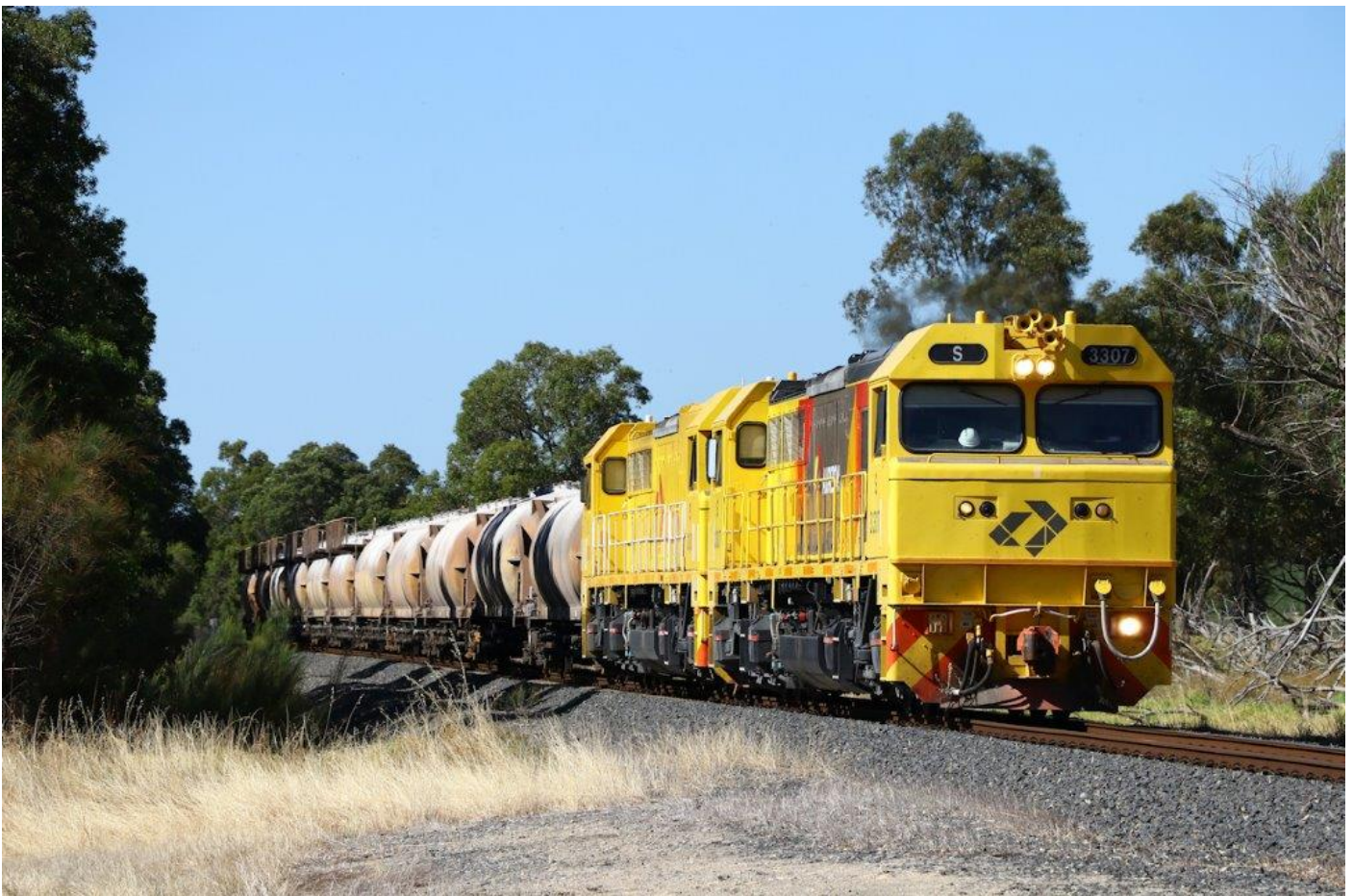
Double S class 3307 & 3301 pass through Wokalup on 2271 lime, 6 th January.