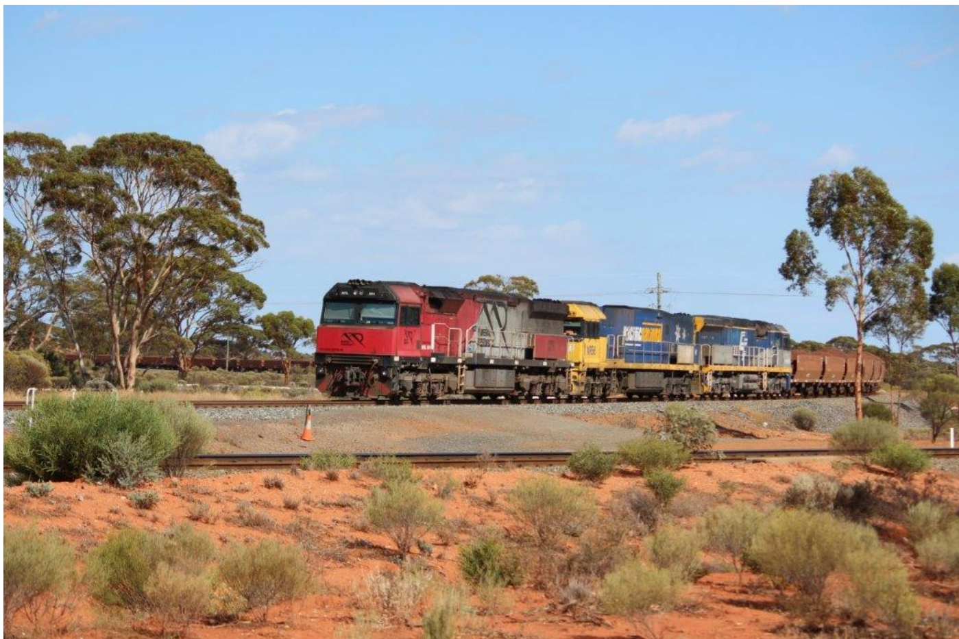
Stabled at Binduli since Sun 29/12 due to Esperance line bushfires, 1035 is headed by MRL004, NR56 & CF4406, 4/1.