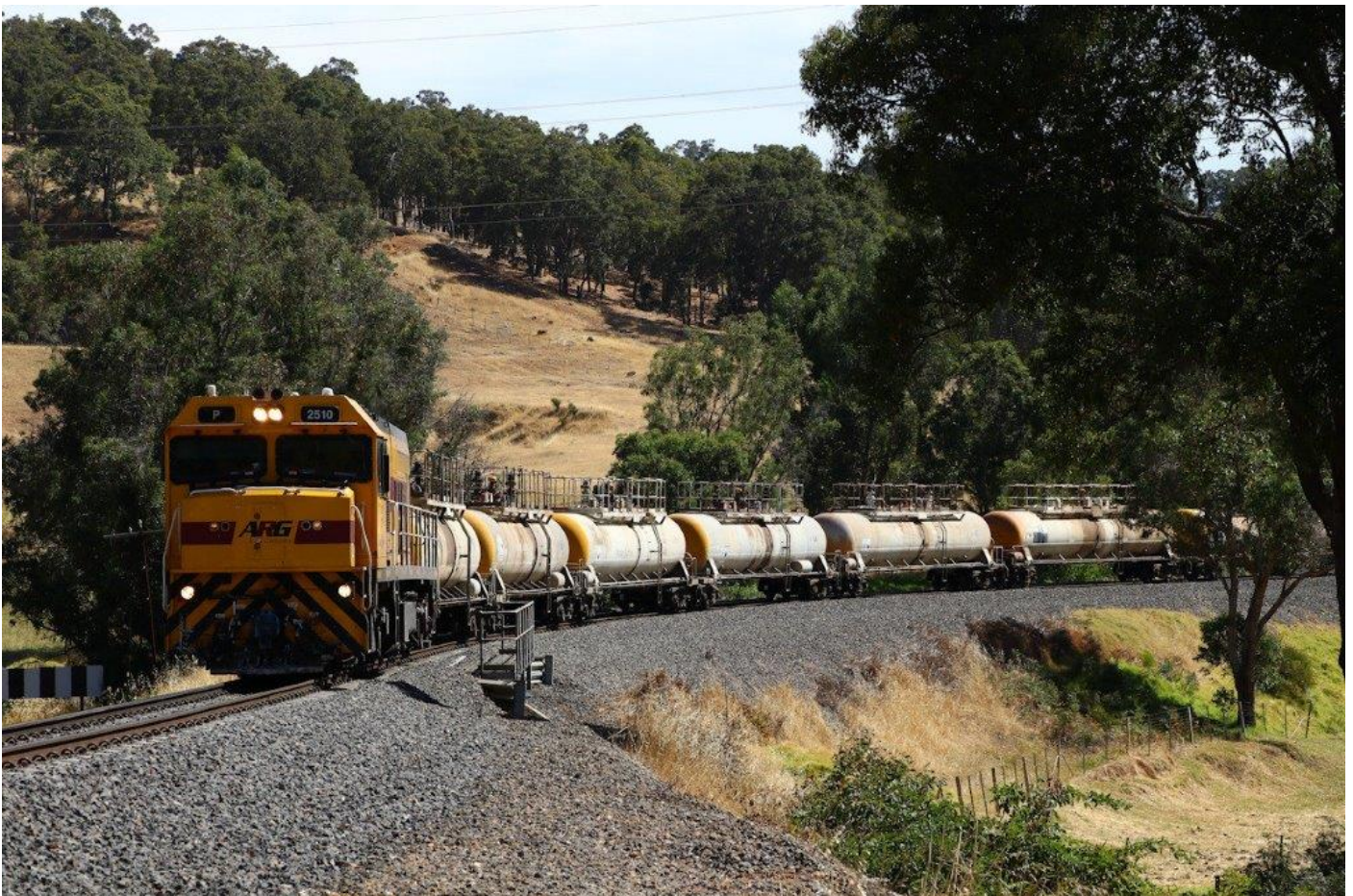
3823 caustic is led through Olive Hill (Collie line) by P2510, 7 th January.