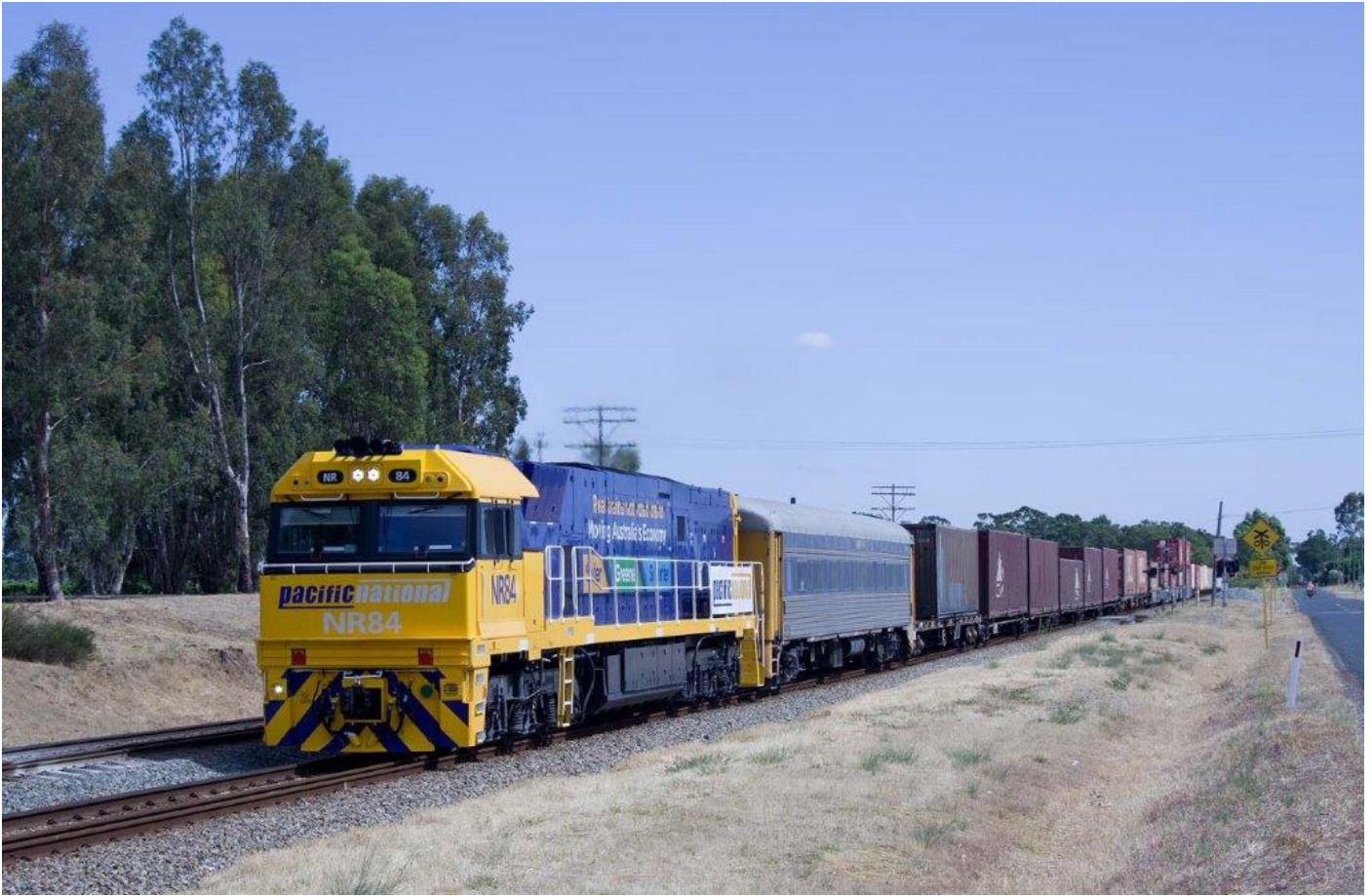
Repainted rail lobby advertising NR84 races through Middle Swan on 2SP7, 2 nd January. NR34 is now the same.