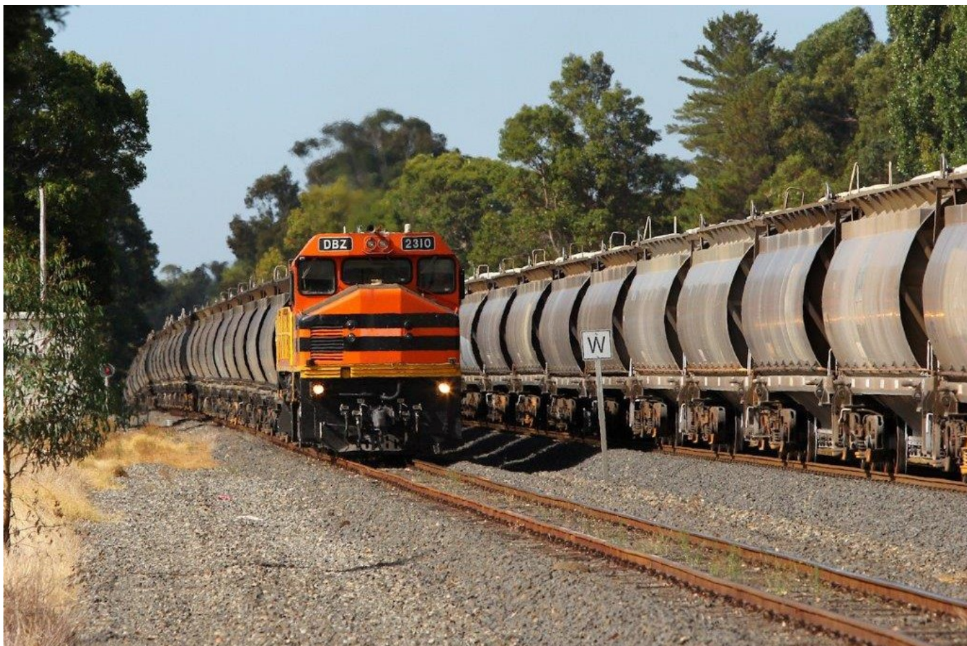
DBZ2310 enters Benger loop with 3875 loaded alumina, 7 th January.