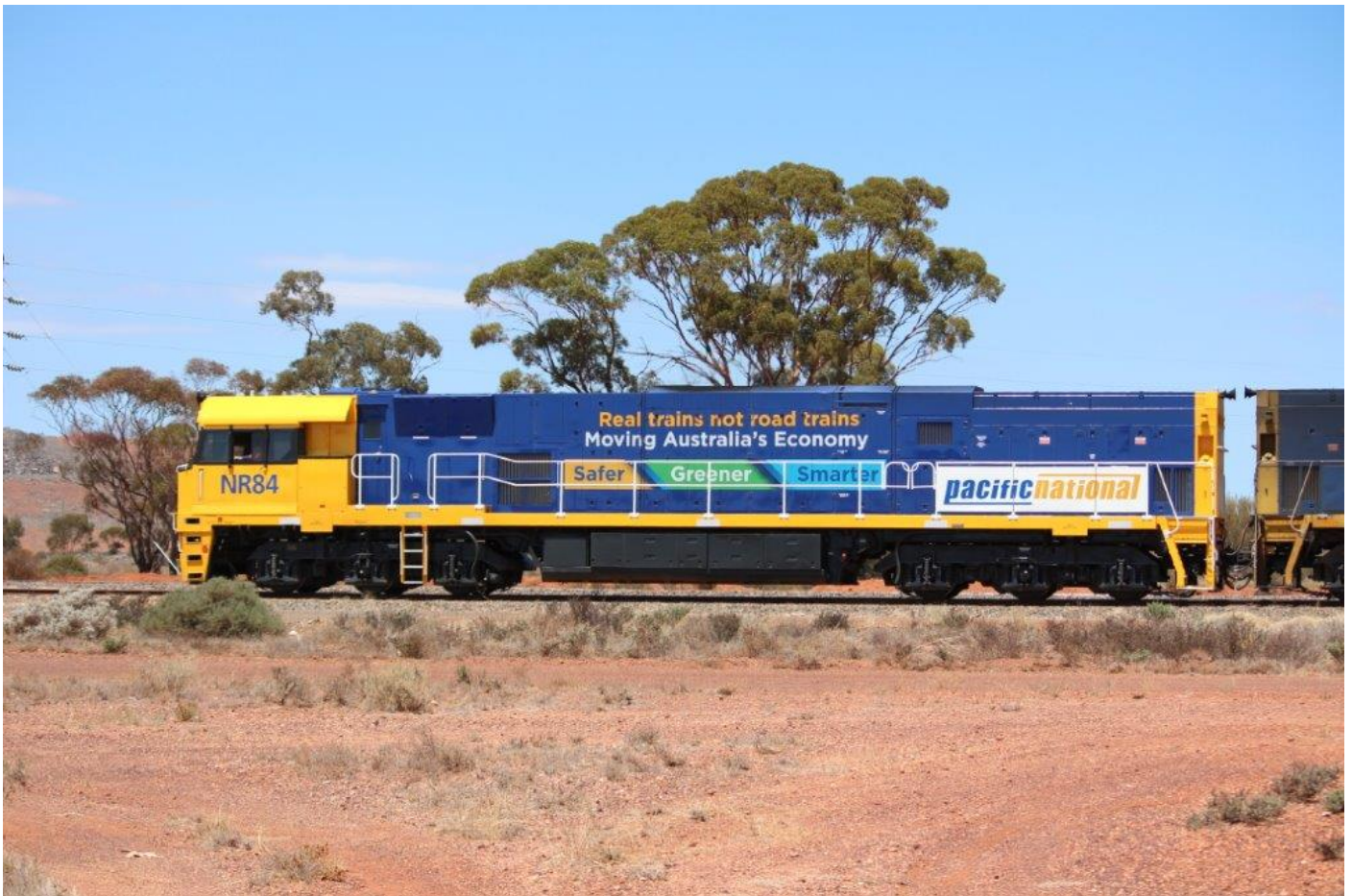
NR84 shows its new rail industry advertising, Parkeston, 4 th January.