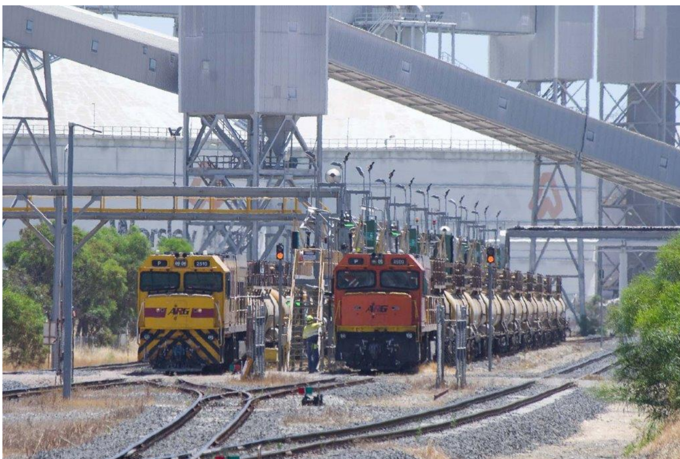
Ps 2510 and 2509 load caustic soda trains at Bunbury, 8 th January.