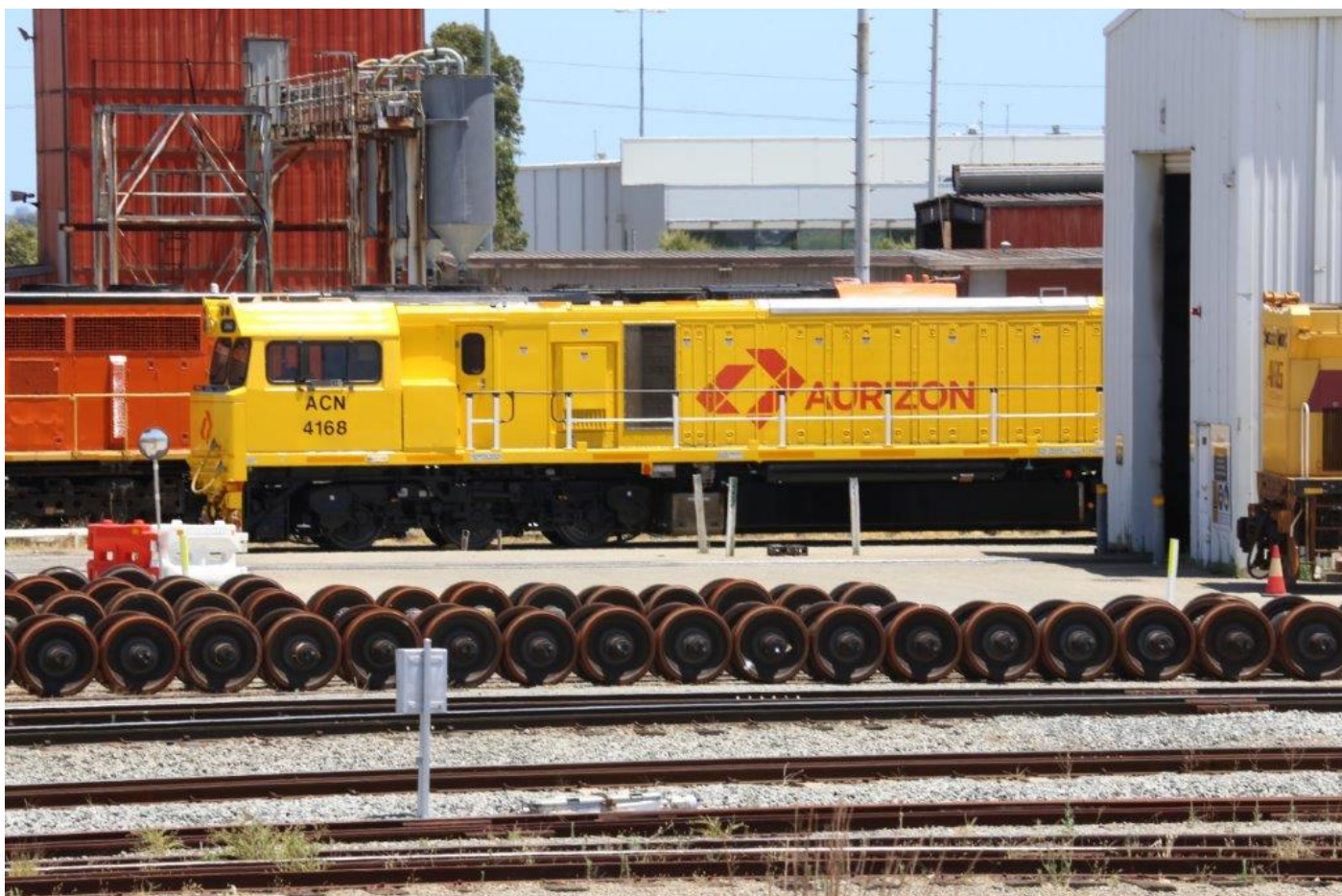
Freshly overhauled ACN4168 at Forrestfield, 18 th January.