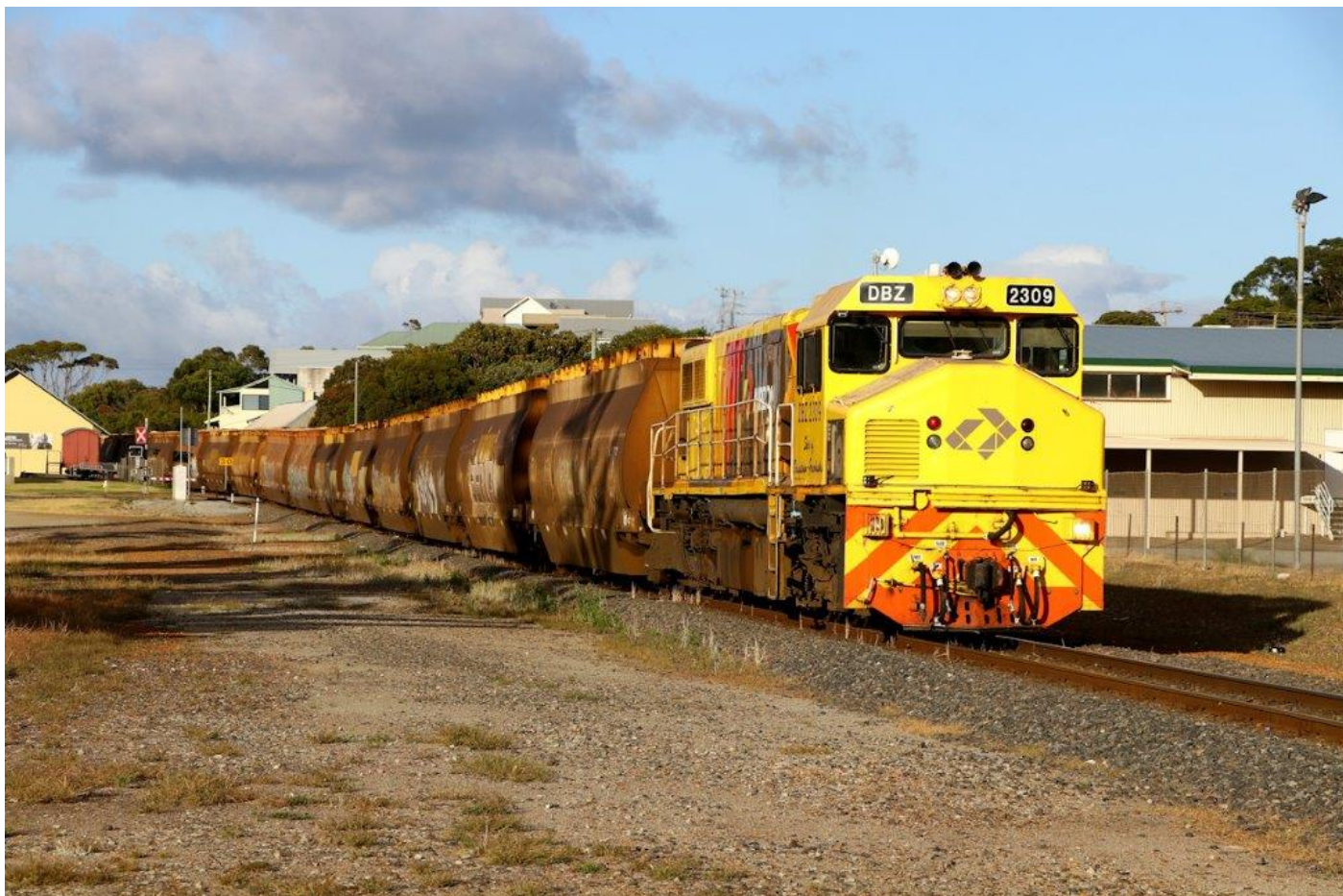
As the sun sinks low, 5601 loaded woodchip service is led out of Albany by DBZ2309, 9 th January.