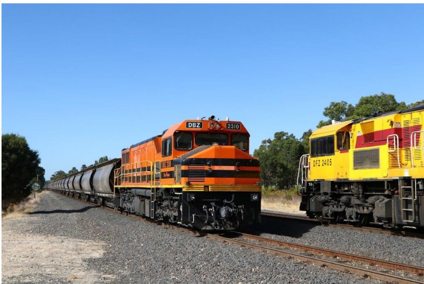
DBZ2310 and 3875 loaded alumina wait on Benger loop to cross DFZ2405 on 3924 loaded caustic, 7 th January.