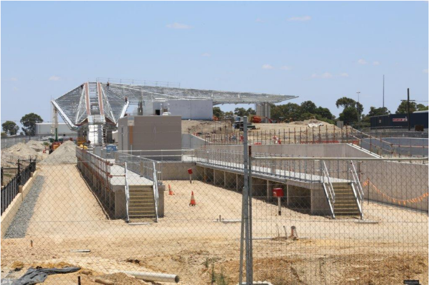
Another angle of the new Forrestfield station, 18 th January.