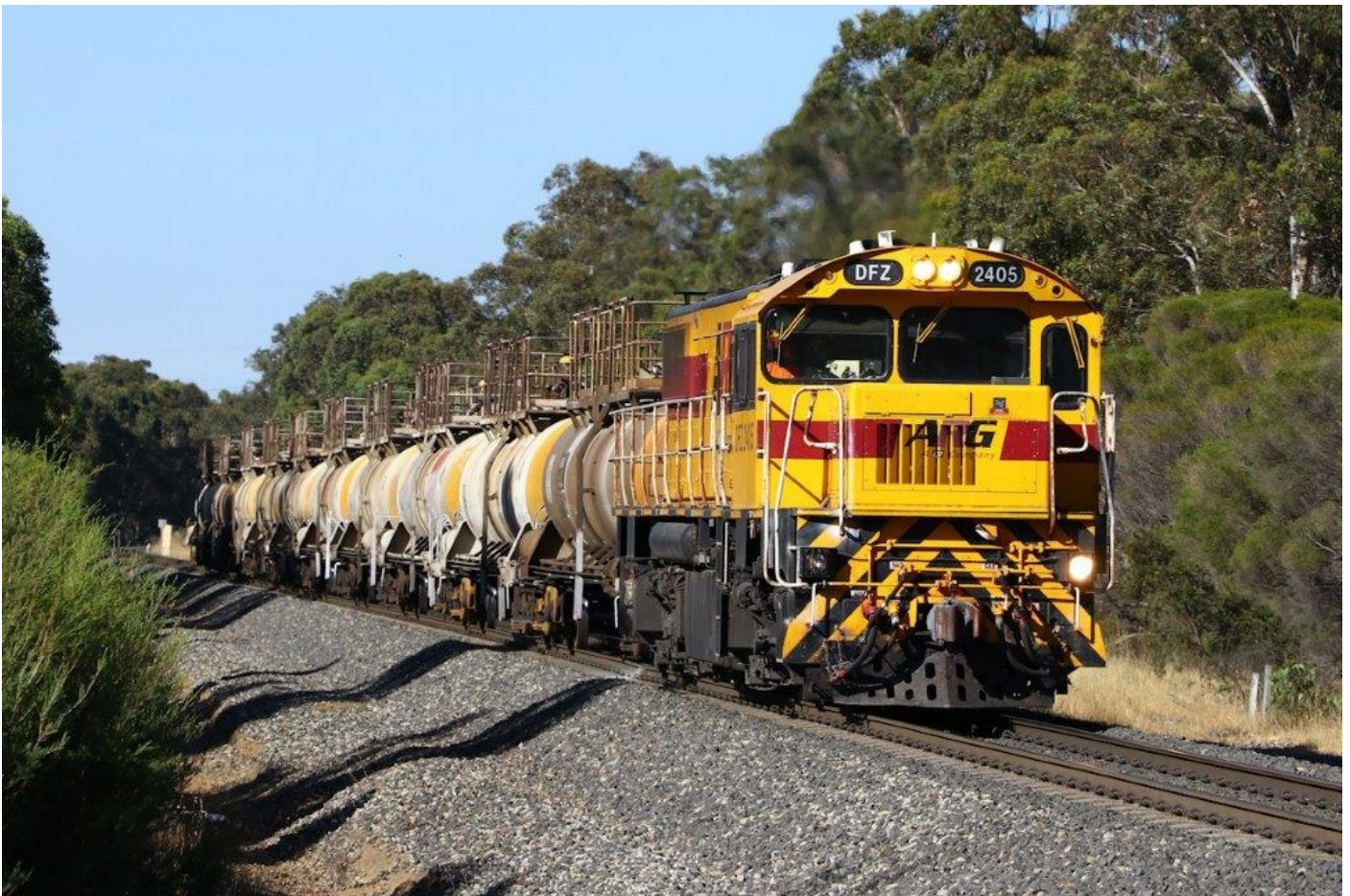
Another load of caustic soda passes through Burekup behind DFZ2405, 7 th January.