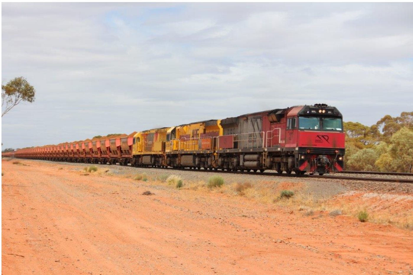
Operated by PN, 1033 loaded ore had MRL003 leading leased Aurizon units AC4308 & ACC6032, approaching Binduli (above) and halfway to Hampton (below), 12 th January.