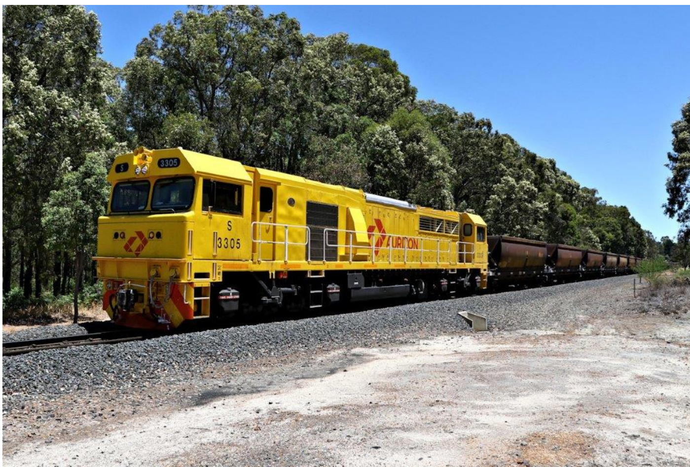
Corporate-liveried S3305 heads an empty Worsley coal service through Allanson, 6 th January.