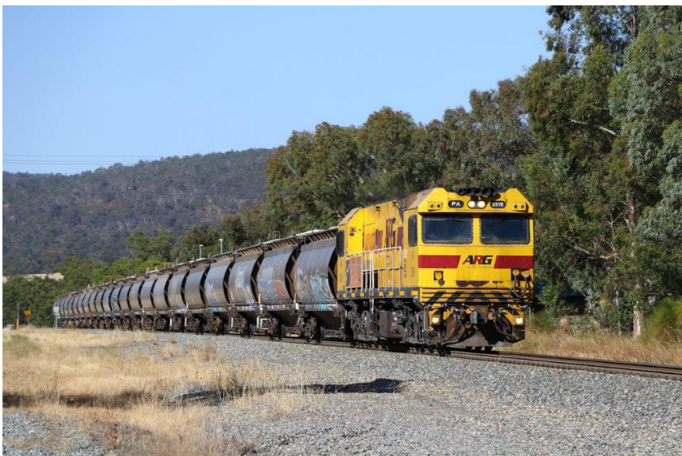
Former Queensland GE PA2819 heads 6223 empty alumina at North Dandalup, 10 th January.