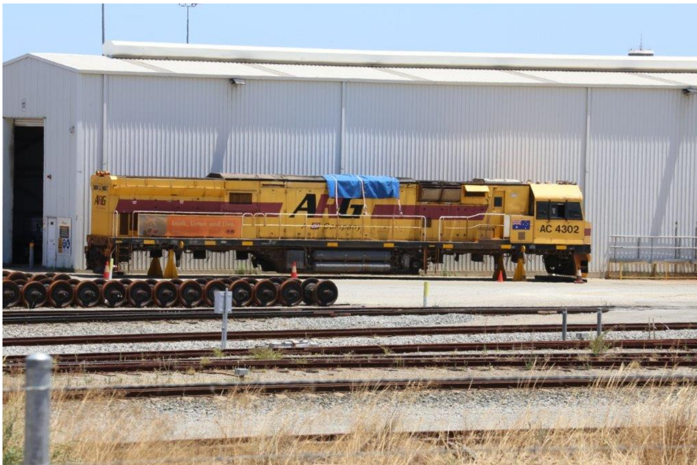
Still awaiting lengthy reactivation work, AC4302 sits at Forrestfield, 18 th January.