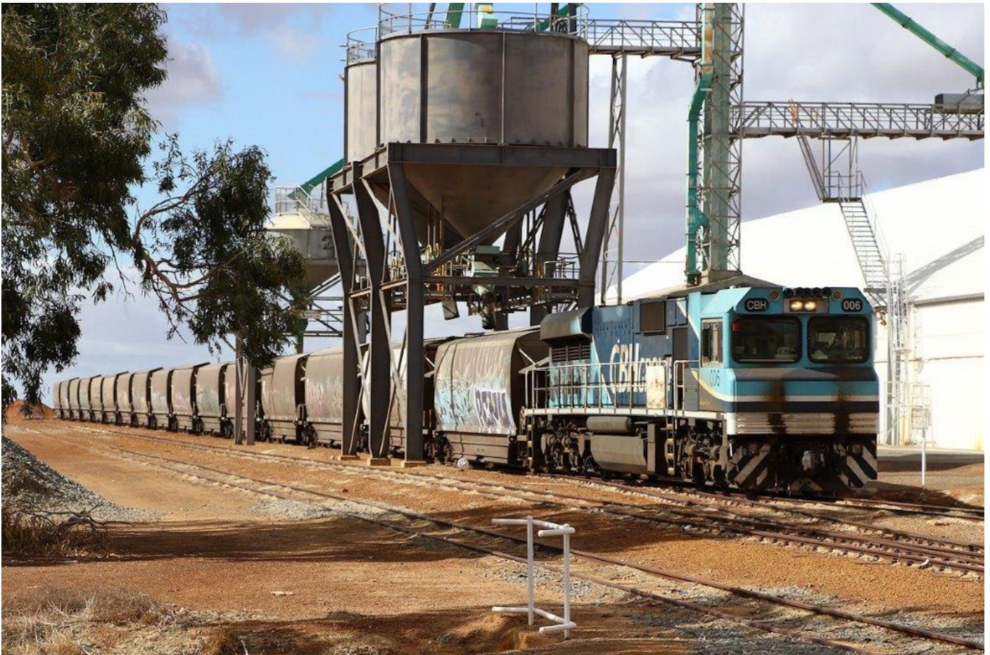
Led by CBH006, 6G31 grain loads at Morawa, 3 rd January. Page 3 of 27