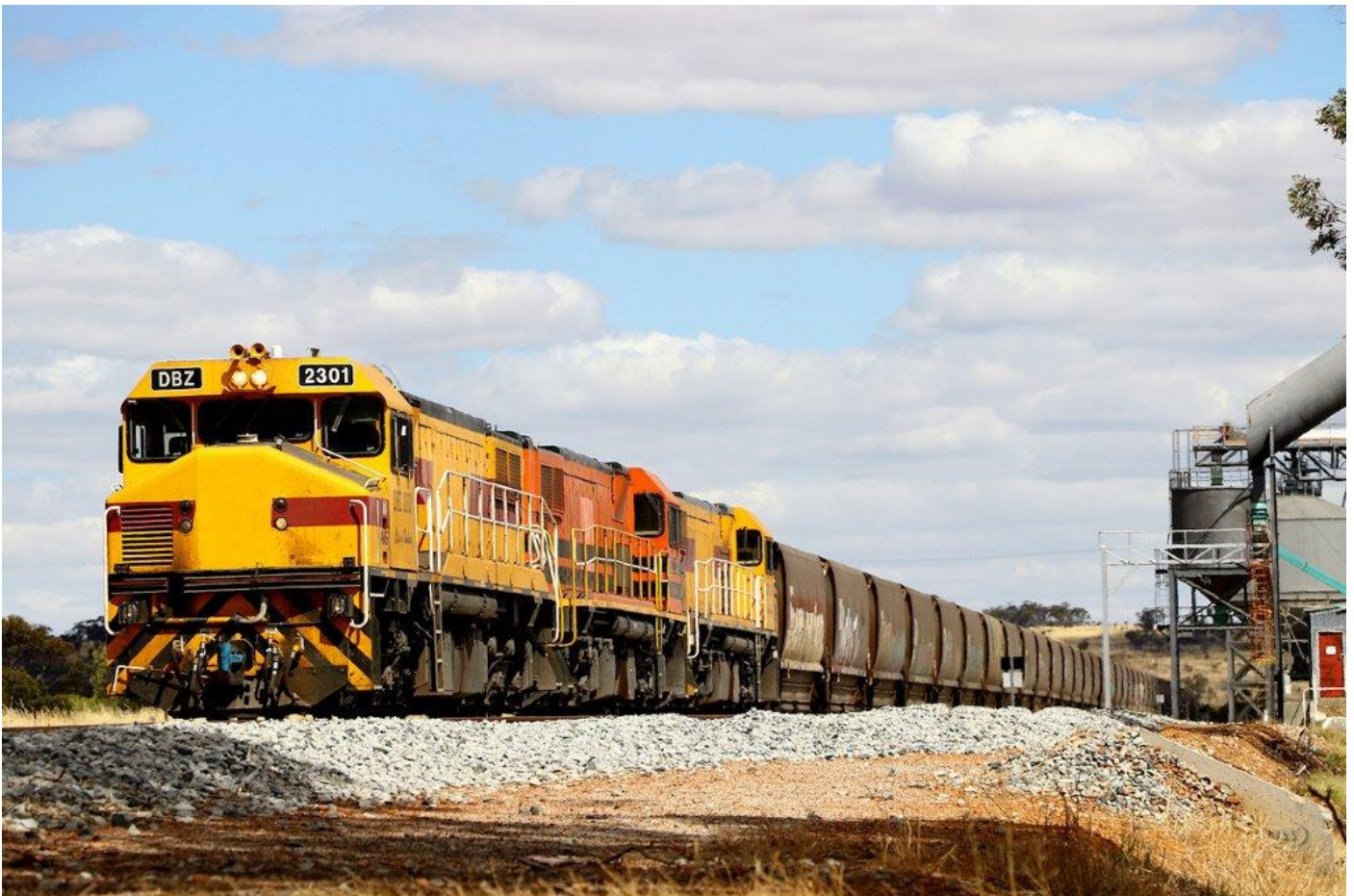
DBZs 2301, 2302 & 2305 stand at York on a loaded grain, 3 rd January.