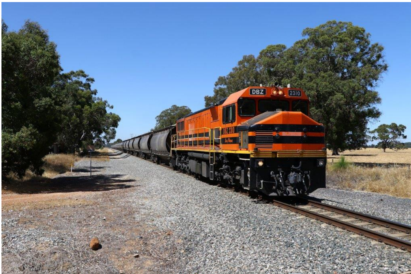
DBZ2310 rolls through Blythewood on 3874 empty alumina, 7 th January.