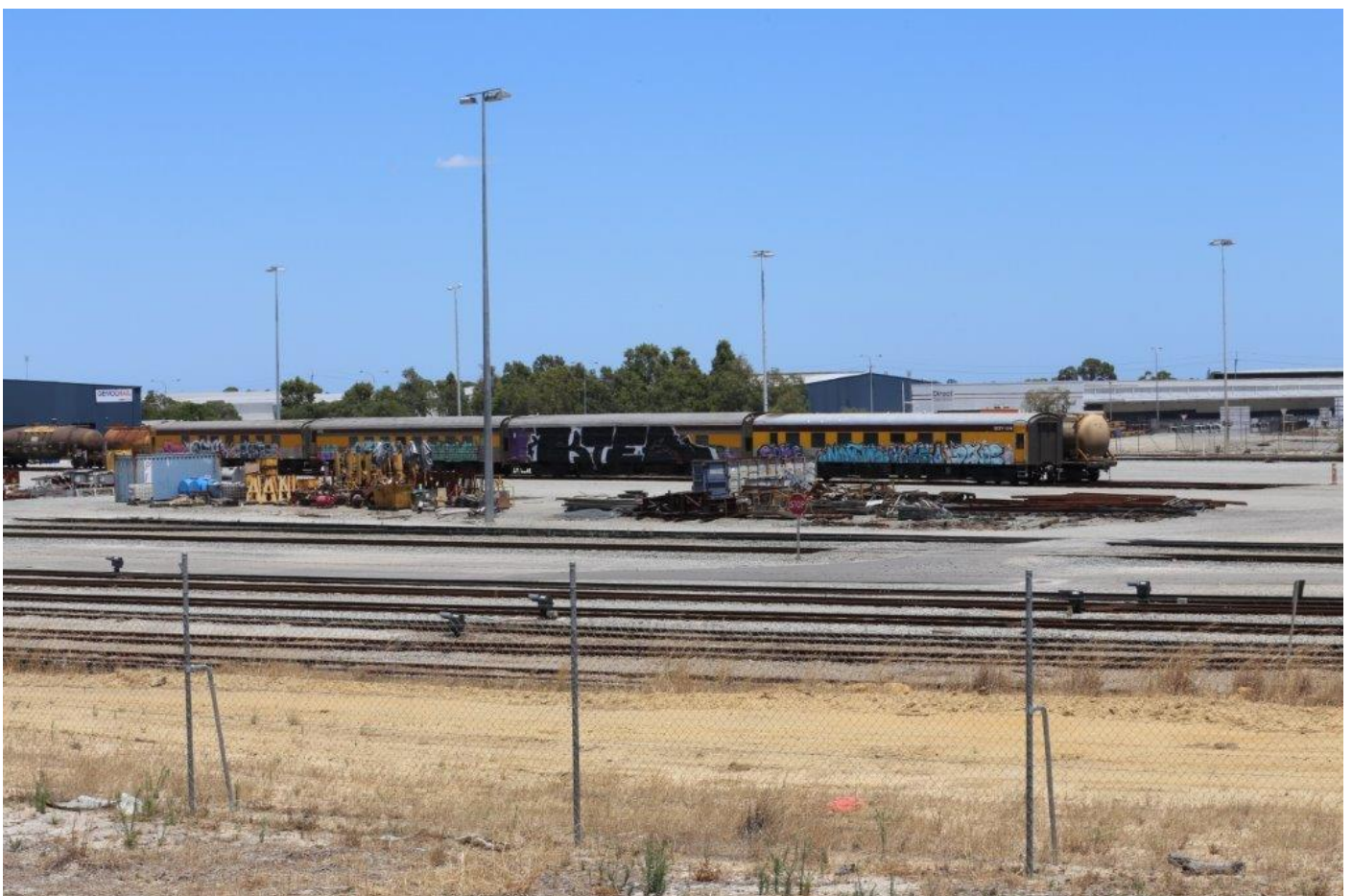
Aurizon Intermodal's four crew coaches mothballed at Forreestfield, 18 th January.