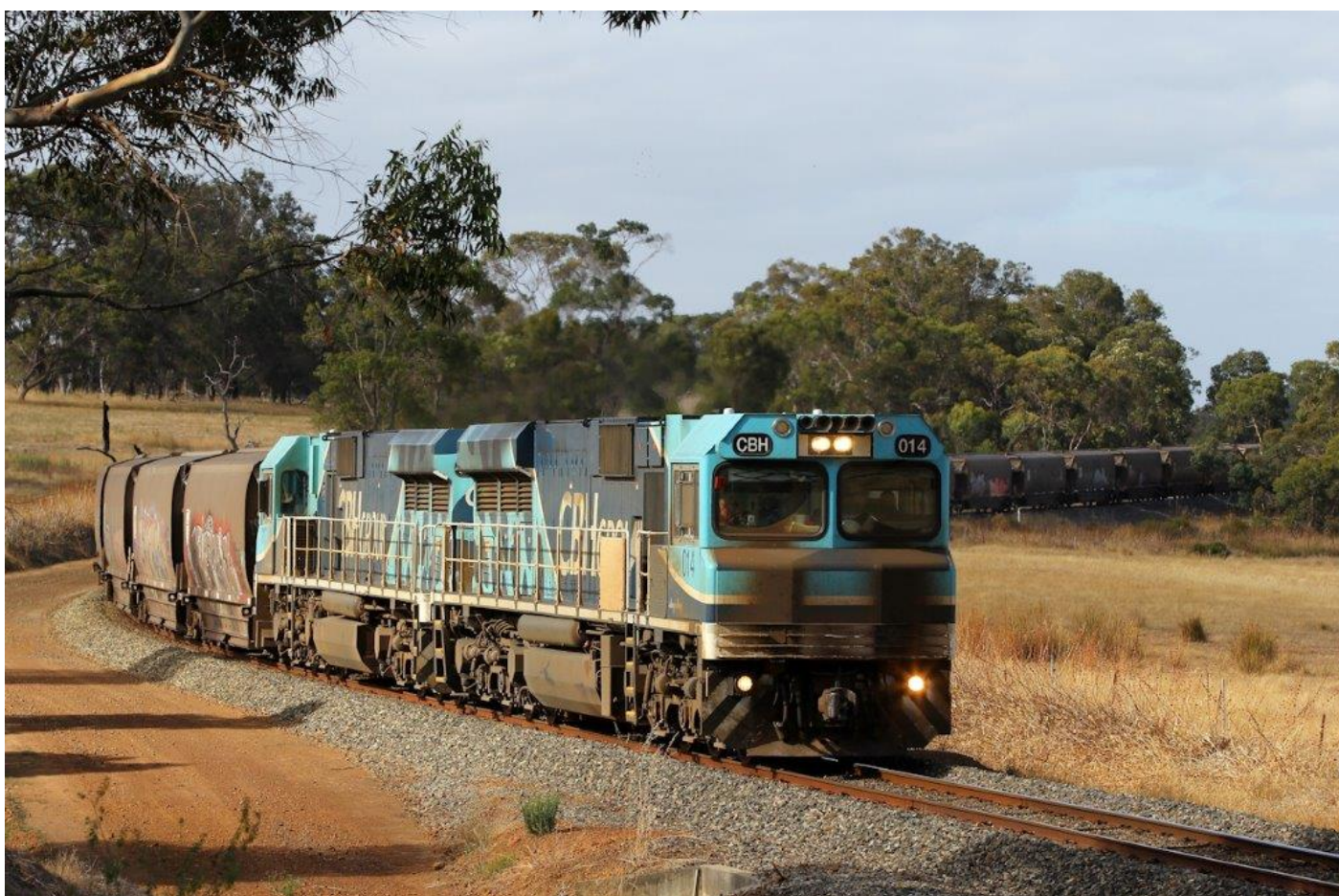
CBHs 014 & 017 haul 6A82 to Lake Grace through Mount Barker, 10 th January.