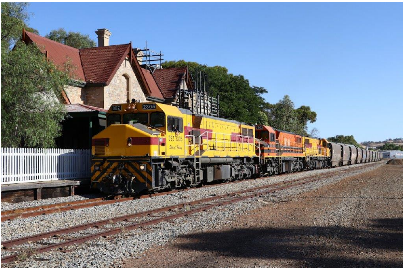
7K06 grain waits at York behind DBZ2305, 2302 & 2301, 4 th January.