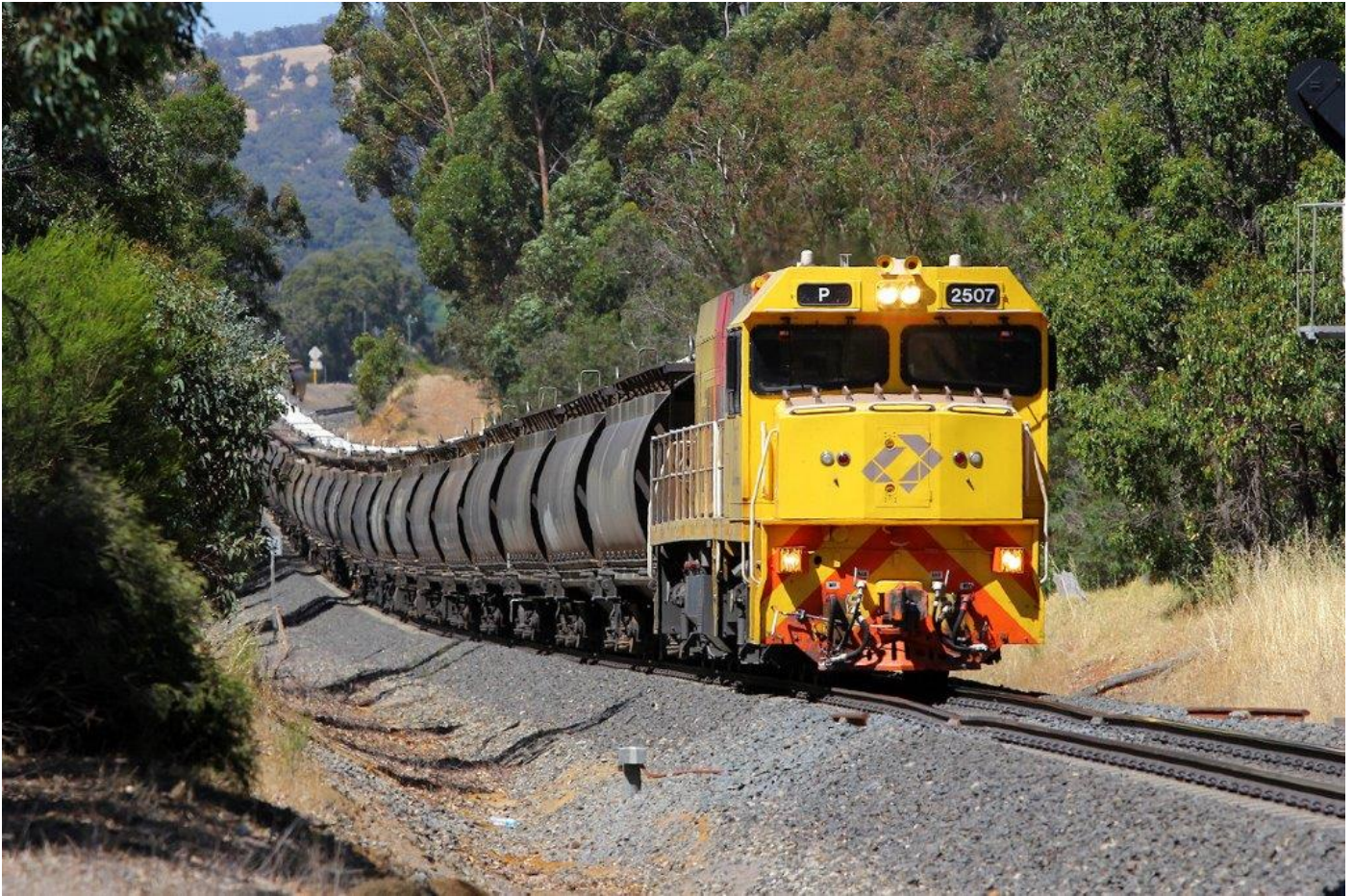
P2507 approaches a nasty dip in the track with 3865 loaded alumina, Burekup, 7 th January.