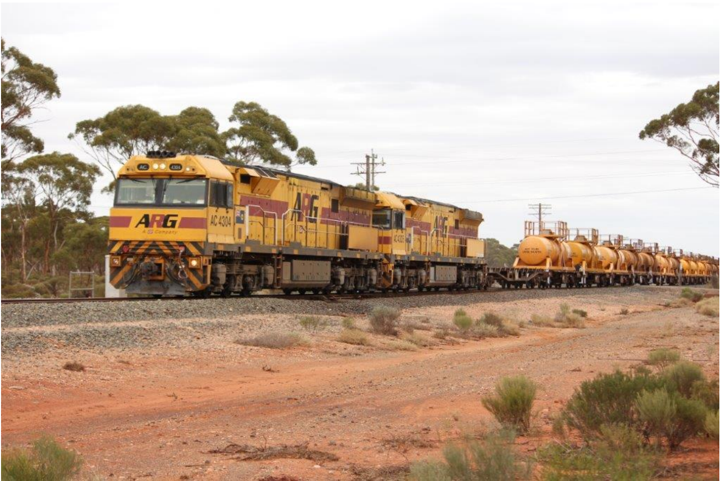
ACs 4304 & 4305 lead 1405 empty acid into Hampton, 12 th January.