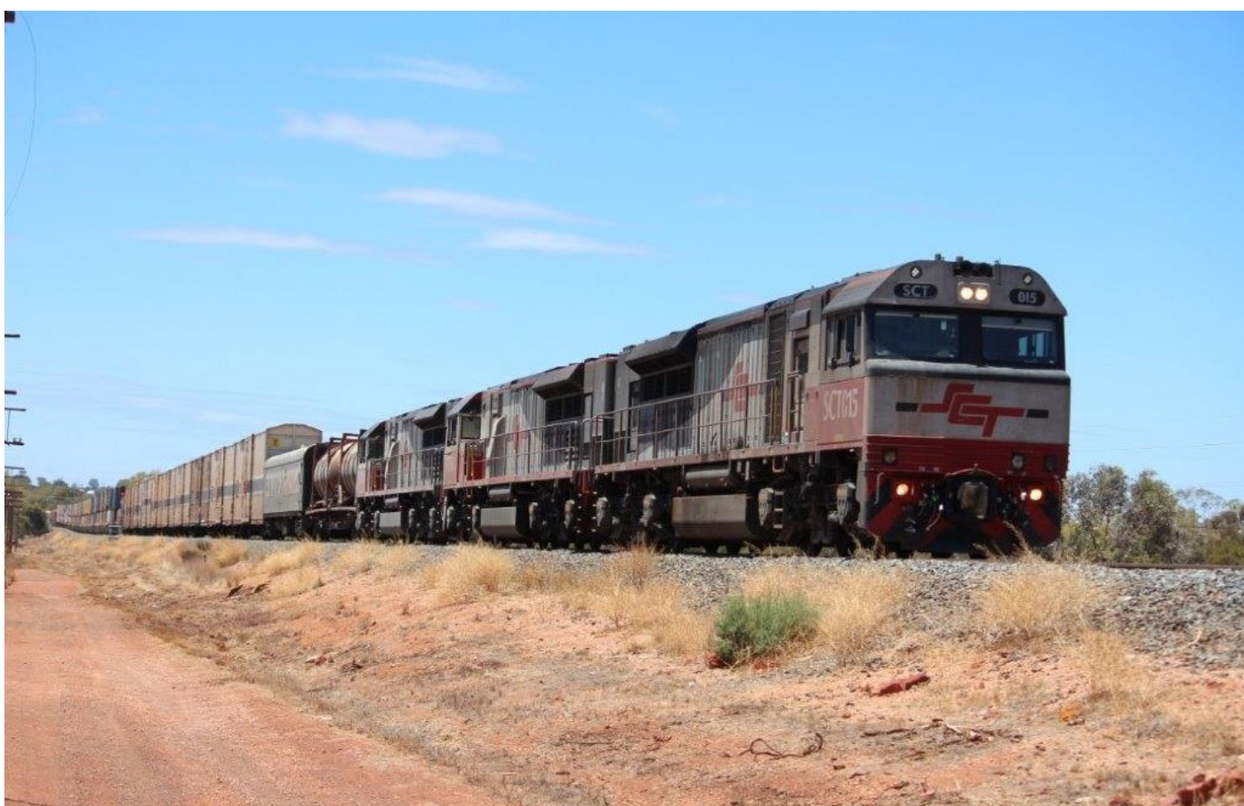
SCTs 015, 003 & 010 pass through Kalgoorlie on 5MP9, 11 th January. SCT010 was included for 6PM9 further west, the latter having donated one of its locos two days earlier.