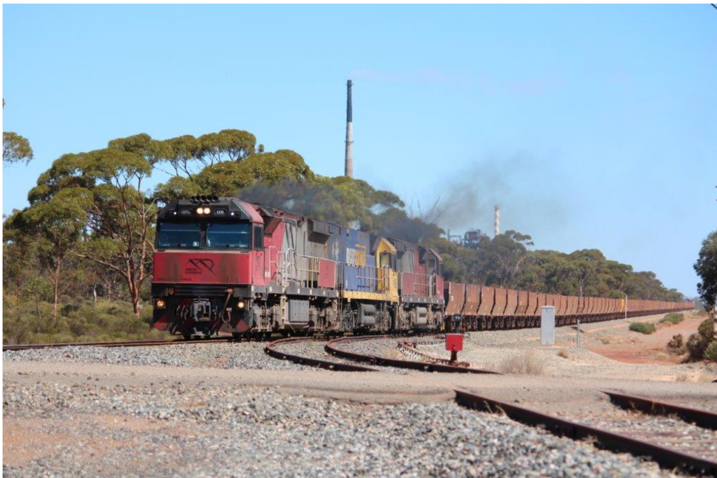
MRL006, NR56 & MRL004 smoke away from Hampton with 7030 empty ore, 11 th January.