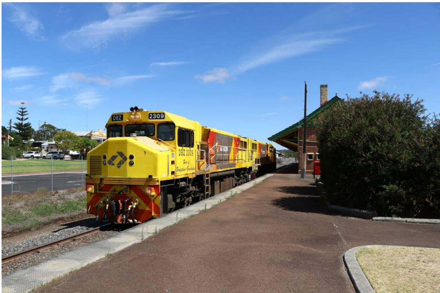
DBZs 2309 & 2311 form 3305 light engine at Mt Barker, 8 th January.