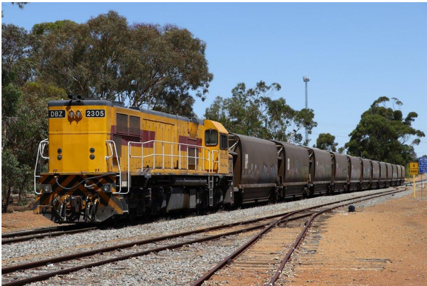
DBZ2305 shunts Brookton, 5 th January.