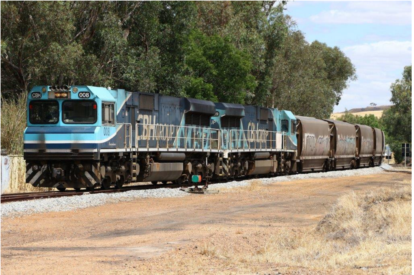
6K06 passes through York behind CBHs 008 & 009, 3 rd January.