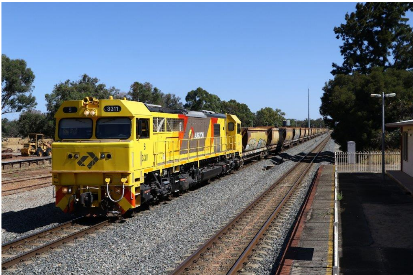
S3311 sits at Pinjarra with 6972 loaded bauxite, 10 th January.