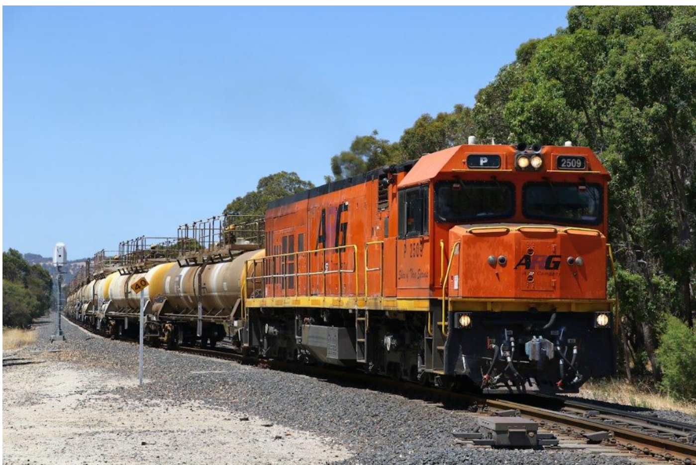
P2509 creeps out of Burekup loop with 6922 empty caustic, 10 th January.