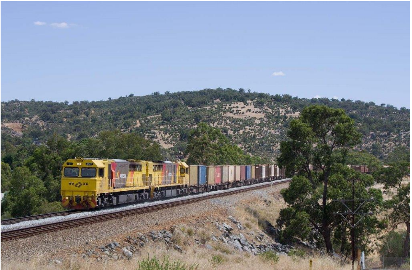
4430 ex Malcolm passes through Brigadoon behind Qs 4006 & 4011, 2 nd January.