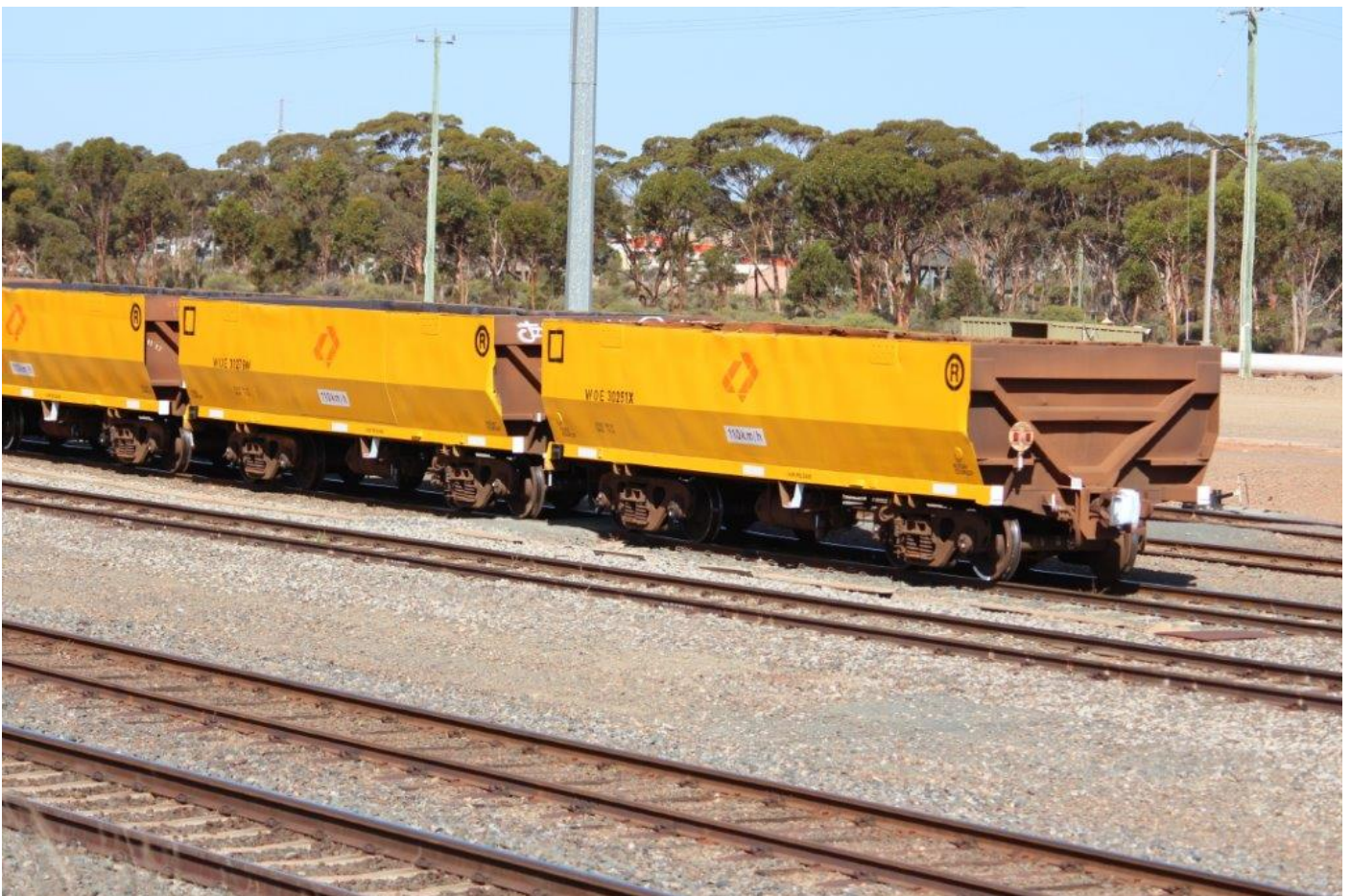
120 WOE's were reactivated and partly painted yellow with Aurizon logo for Kooly traffic. West Kal yard, 16/1.