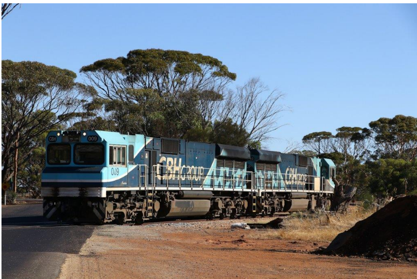
CBHs 009 & 010 shunting 7K53, Moora, 11 th January.