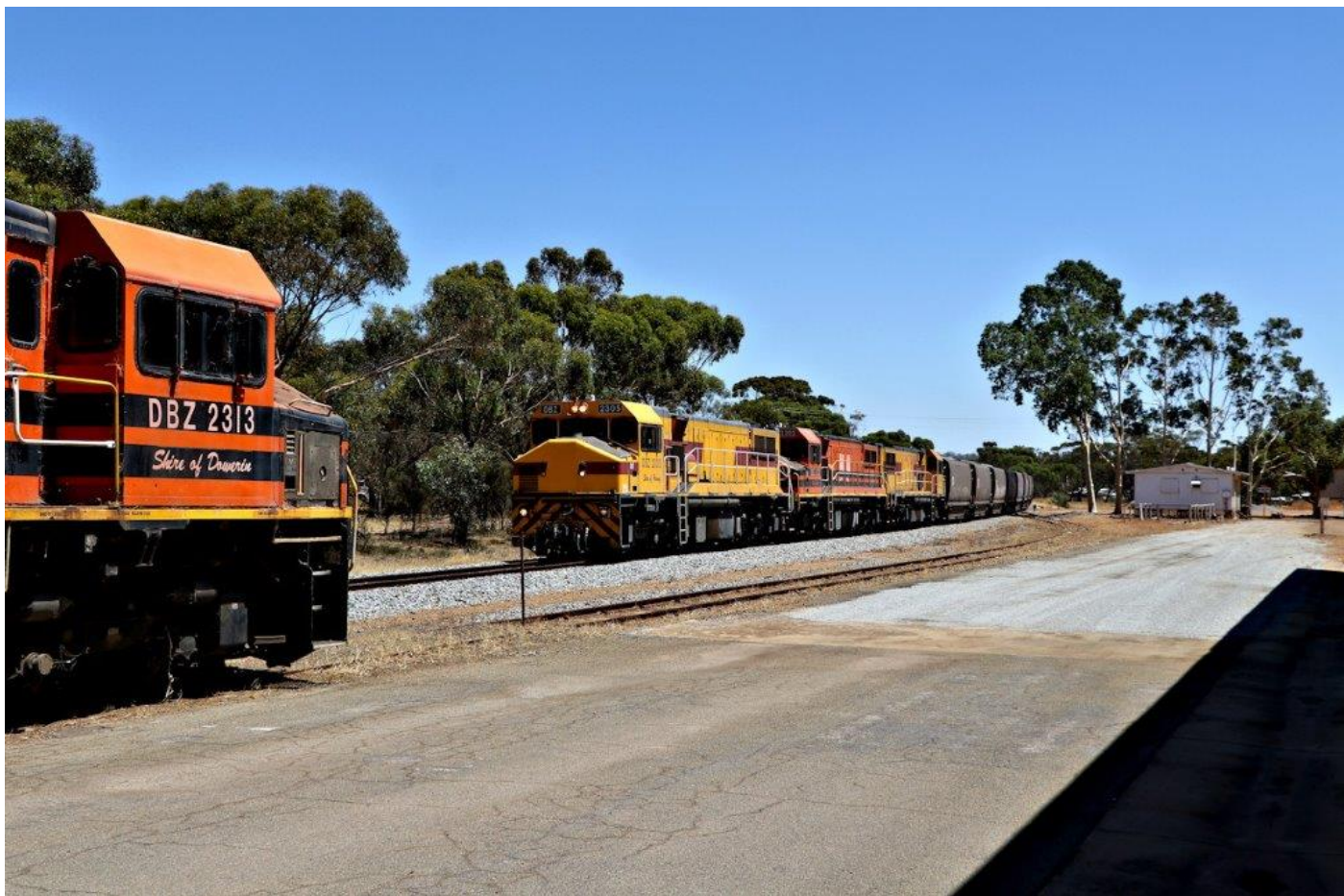
Stored DBZ2313 looks on as sisters 2305, 2302 & 2301 pass through Beverley on a grain working, 5 th January.