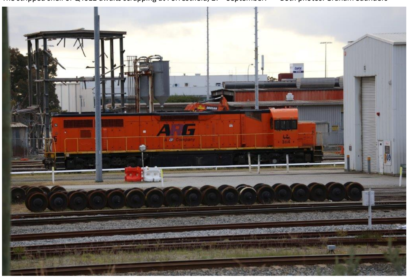
LZ3114 stored, Forrestfield, 27<sup>th</sup> September. Numerous Ls are rumoured for reactivation in the near future. Page 27 of 31