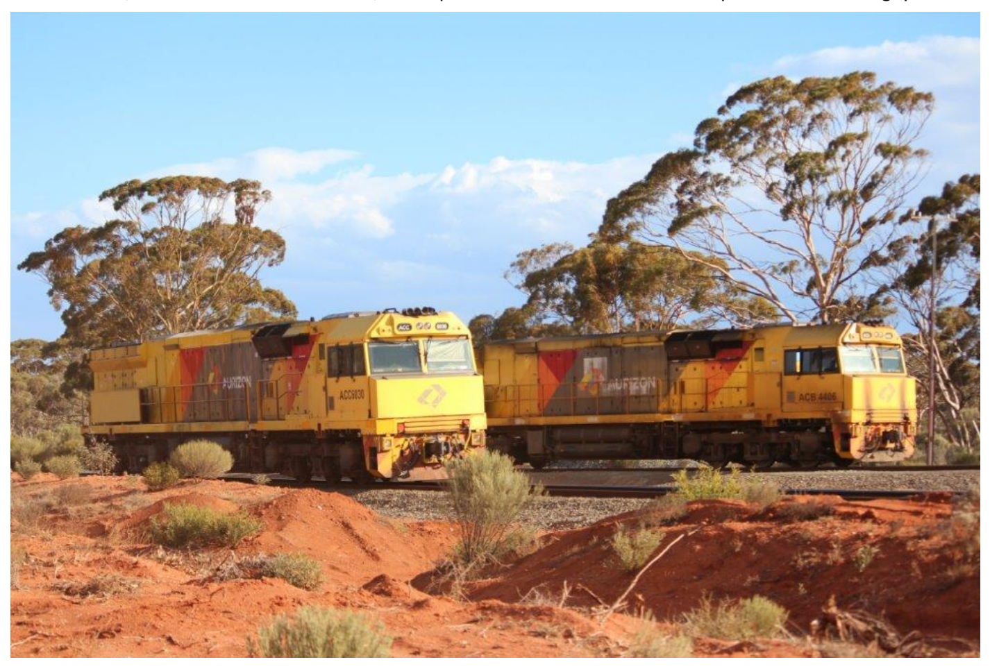
ACB4406 has been removed from 3MR2 to allow ACC6030 to slot in (above), Binduli, 15<sup>th</sup> September.