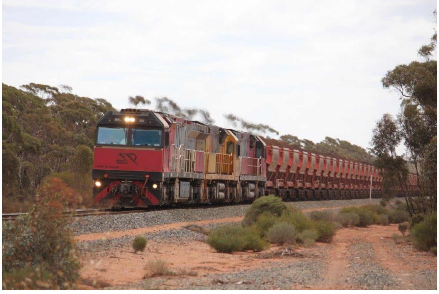
MRL002, ACB4404 & MRL001 on 1MR1 approach Hampton with 126 MHPYs, 20/9. Page 15 of 31