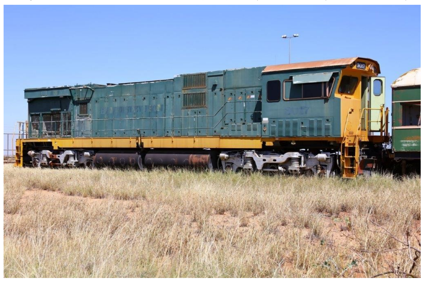
Page 3 of 31