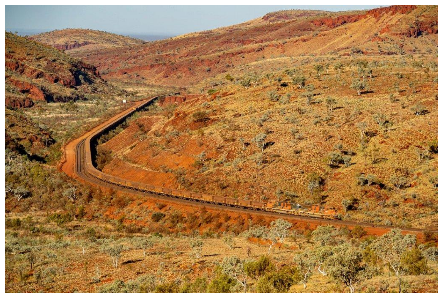
4480 & 4379 run empties from Port Hedland to Yandi at Kurrajura, 17<sup>th</sup> September.