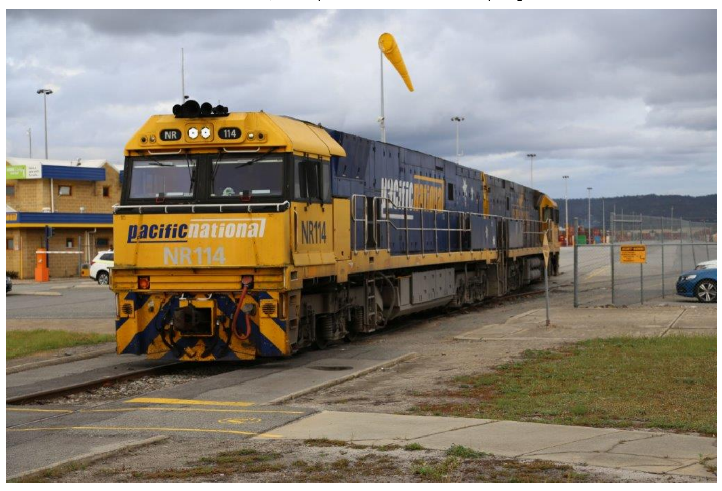
NRs 114 & 28 ex 6SP5, Kewdale, 27^{th} September.