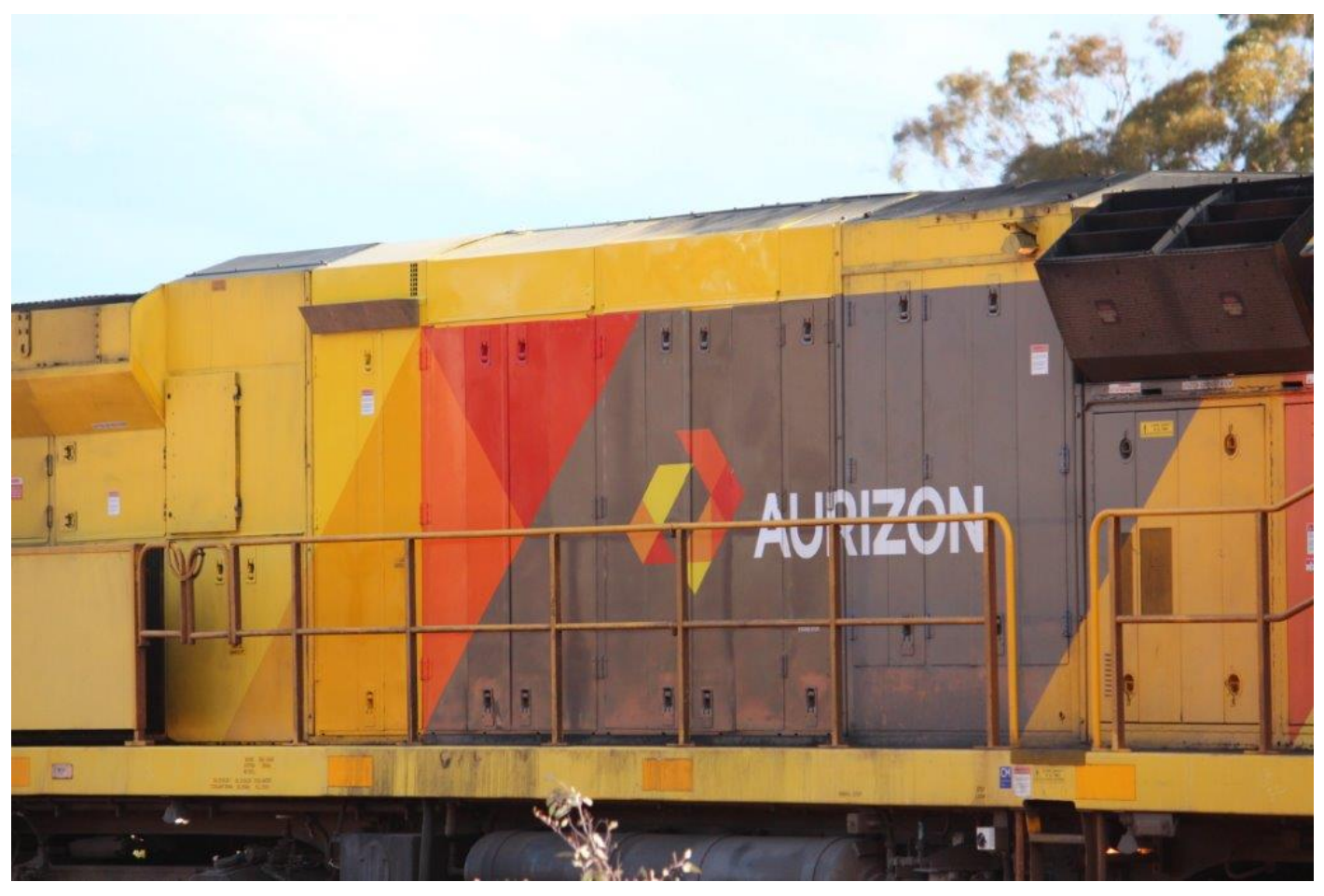
ACC6030 features a few freshly painted hatches after fire damage repairs.