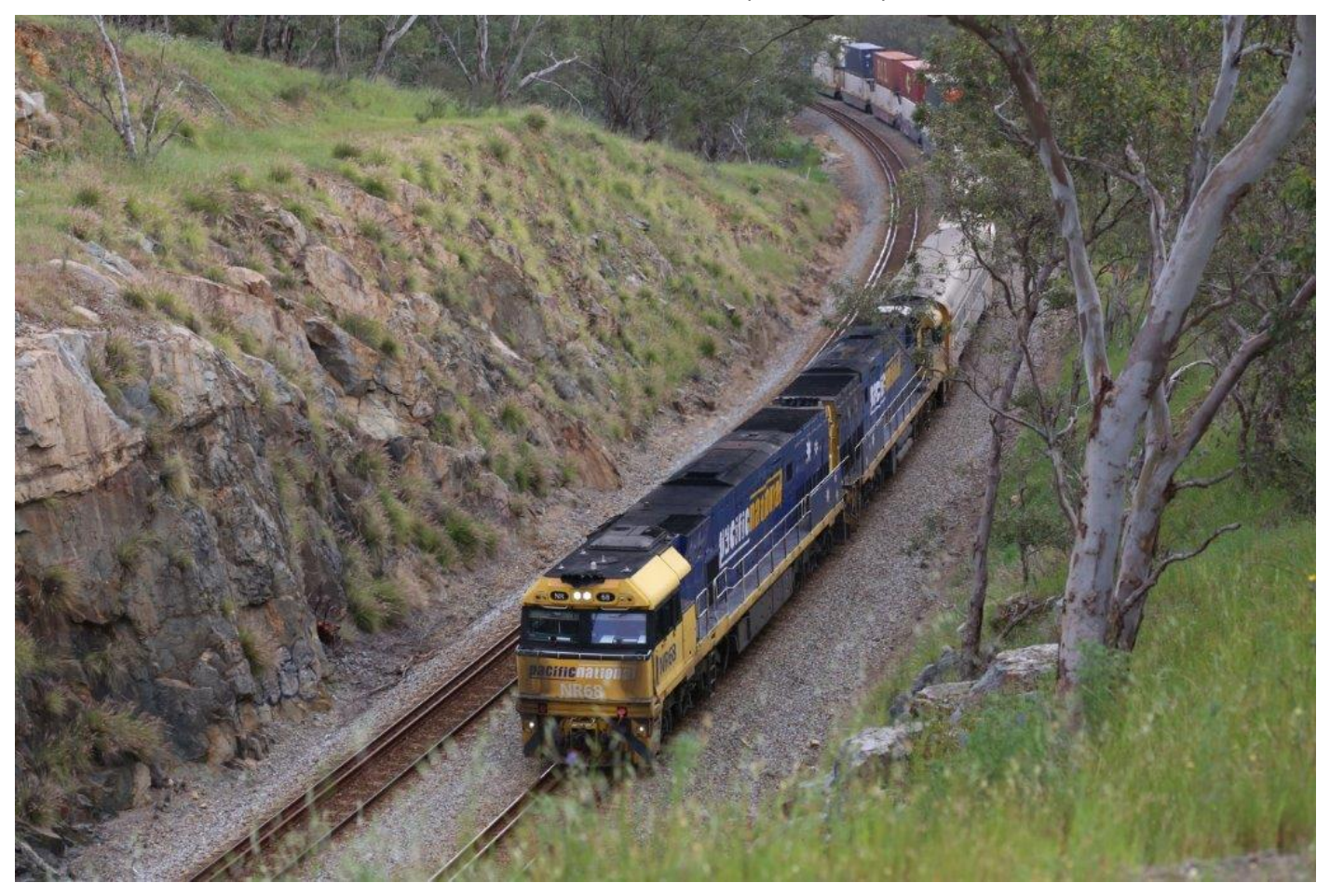
1PM5 is led through Bells Rapids by NRs 68 & 117, 27<sup>th</sup> September.