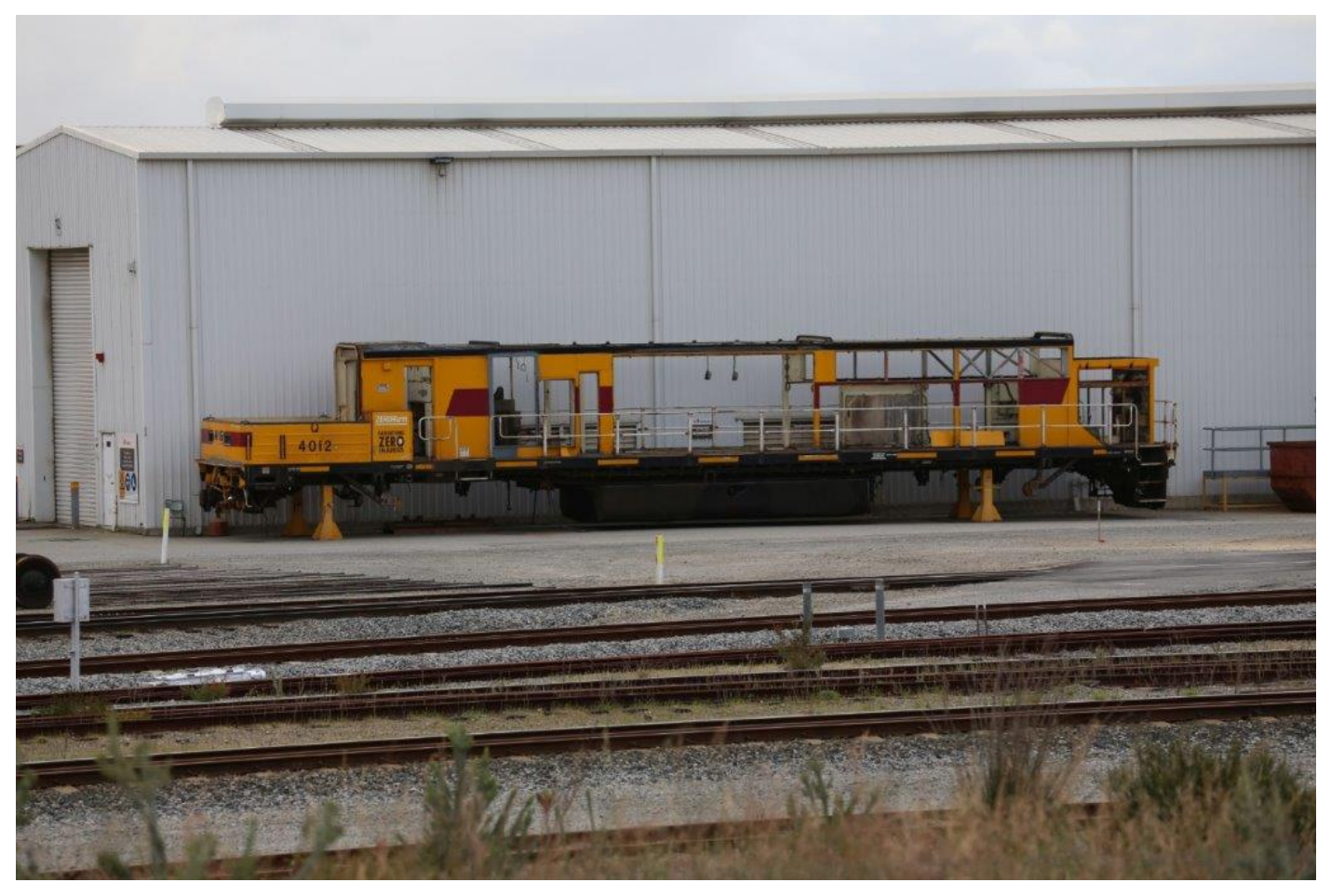
The stripped shell of Q4012 awaits scrapping at Forrestfield, 27<sup>th</sup> September.