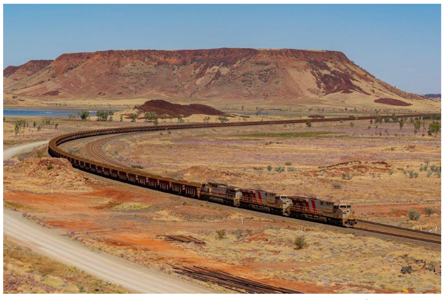
Another load of ore to Cape Lambert passes through Cooya Pooya behind 9120, 9127 & 7087, 14^{th} September. Page 4 of 31