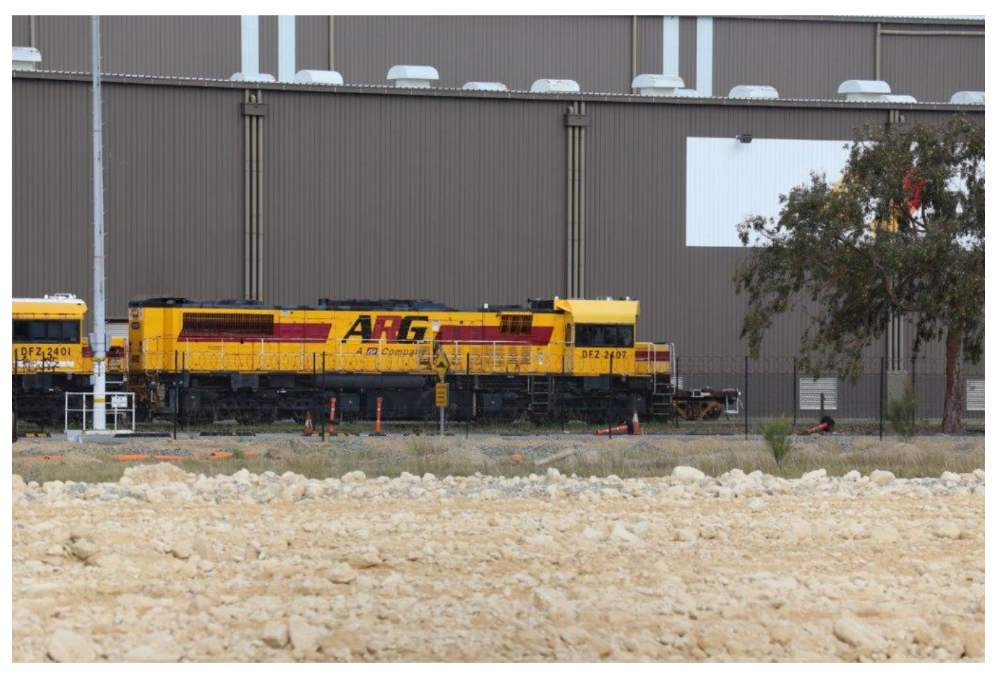
Stored DFZ2407, originally QR's 2463, rebuilt as 2374 in 2001, fitted with taller cab in 2011, Forrestfield, 27/9.