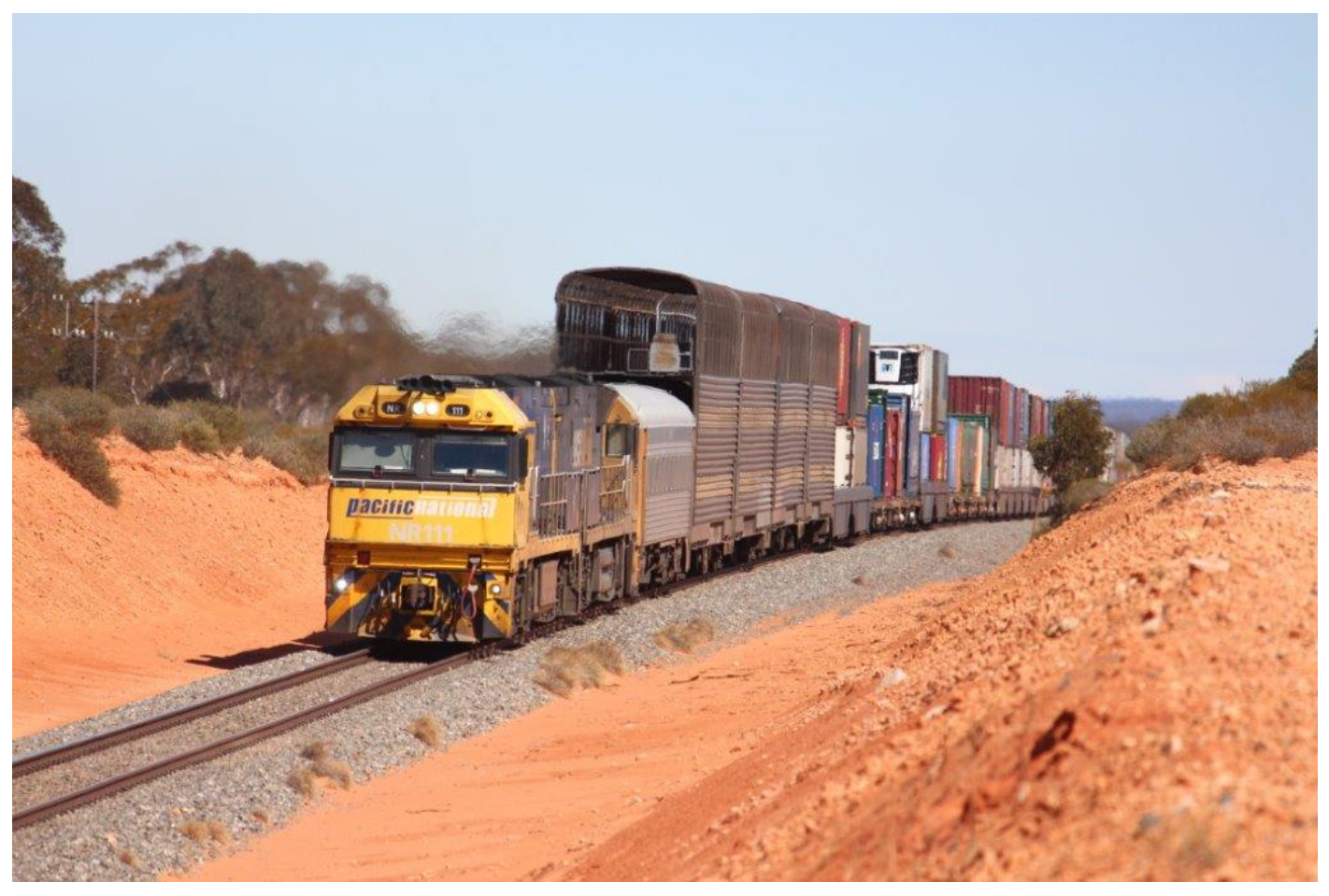
NRs 111 & 72 crest the grade at the 607km between Stewart and Bonnie Vale with 6PM6, 19<sup>th</sup> September. Following the cross at Bonnie Vale, NRs 88 & 51 lead 5SP5 west at the same location.