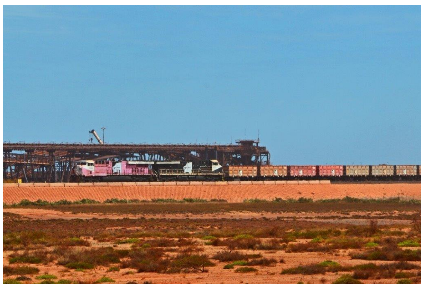
RHAs 1022 & 1014 tipping, 21^{st} September. Page 18 of 31