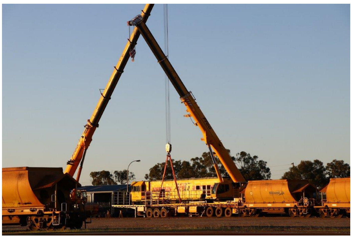
Bogieless\ P2501\ is\ loaded\ onto\ a\ truck\ at\ Narngulu,\ to\ Forrest field\ for\ ongoing\ storage,\ 17^{th}\ September.