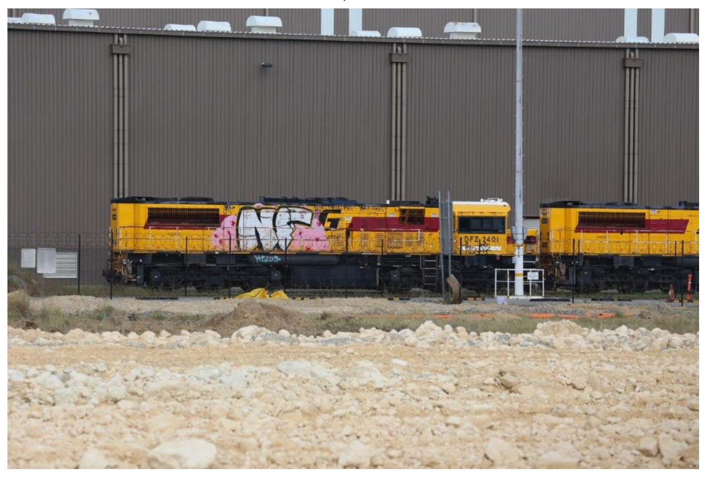
Stored DFZ2401, originally QR's 2451, rebuilt as 2356 in 2001, Forrestfield, 27/9. Page 24 of 31