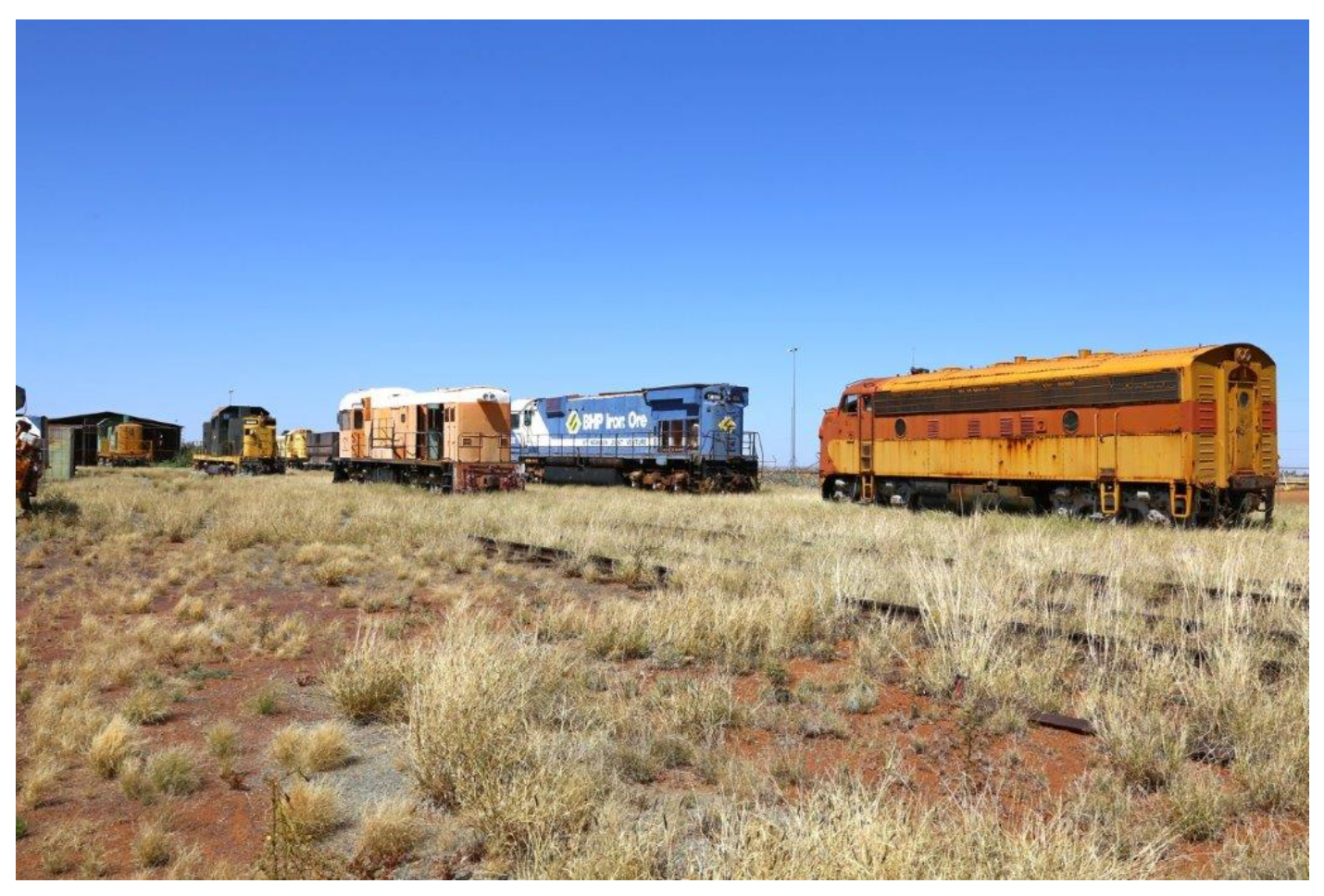
Pilbara Railways Historical Society: HI ALCo S2 007; HI ALCo C415 demonstrator 1000, ex-NSW ALCo RCS-3 Robe 9405 (renumbered to original 4002), EE ST95B Goldsworthy 1, ALCo M636 BHP5502, EMD F7A Mt Newman (above); HI Comeng WA-rebuild with Pilbara cab ALCo C636R 3017 (below), 14<sup>th</sup> September.