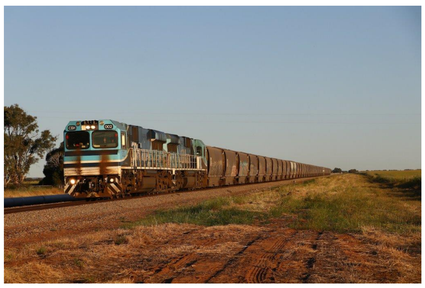
CBHs 002 & 001 team up on 5G51 loaded grain through Georgina, 17^{th} September.