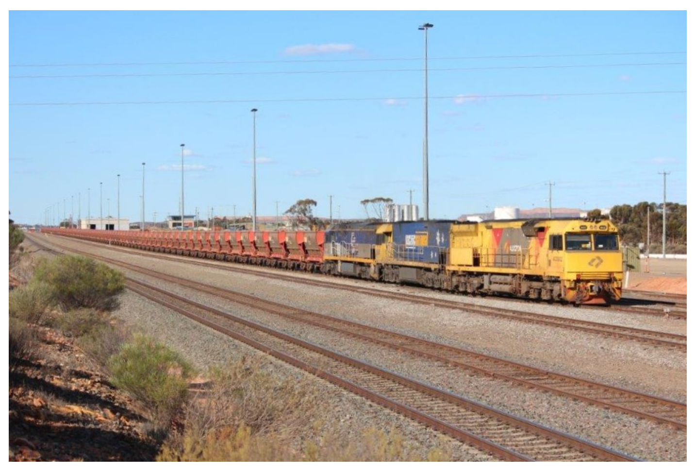
ACC6032, NR41 & CF4408 stabled on 2040 empty ore, West Kalgoorlie, 22<sup>nd</sup> September.