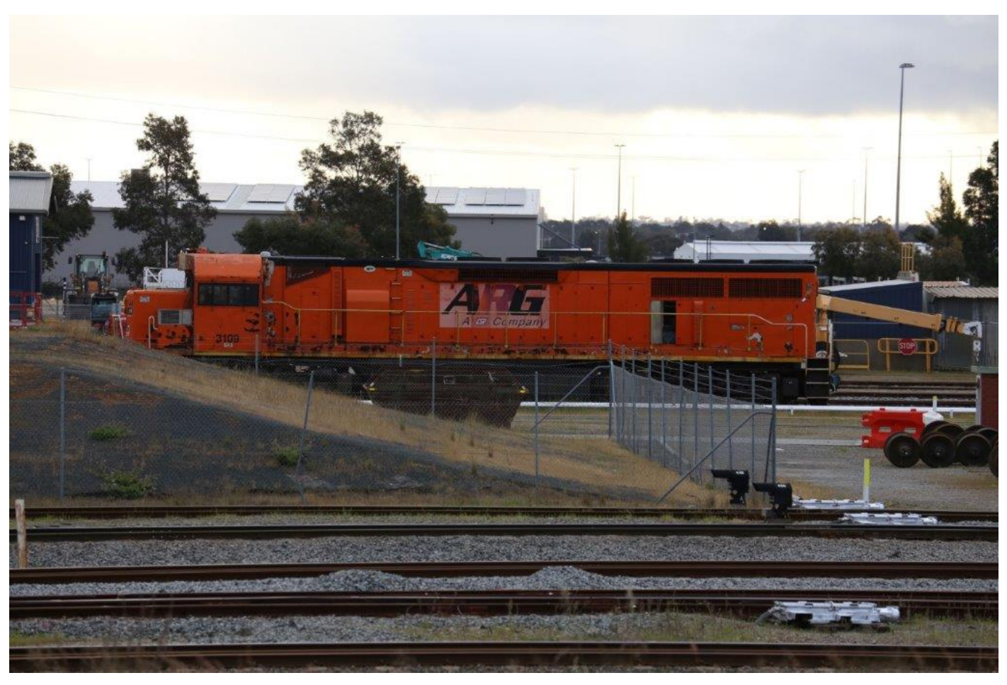
Stored LZ3109 awaits its fate at Forrestfield, 27<sup>th</sup> September. Will it be revived yet again?