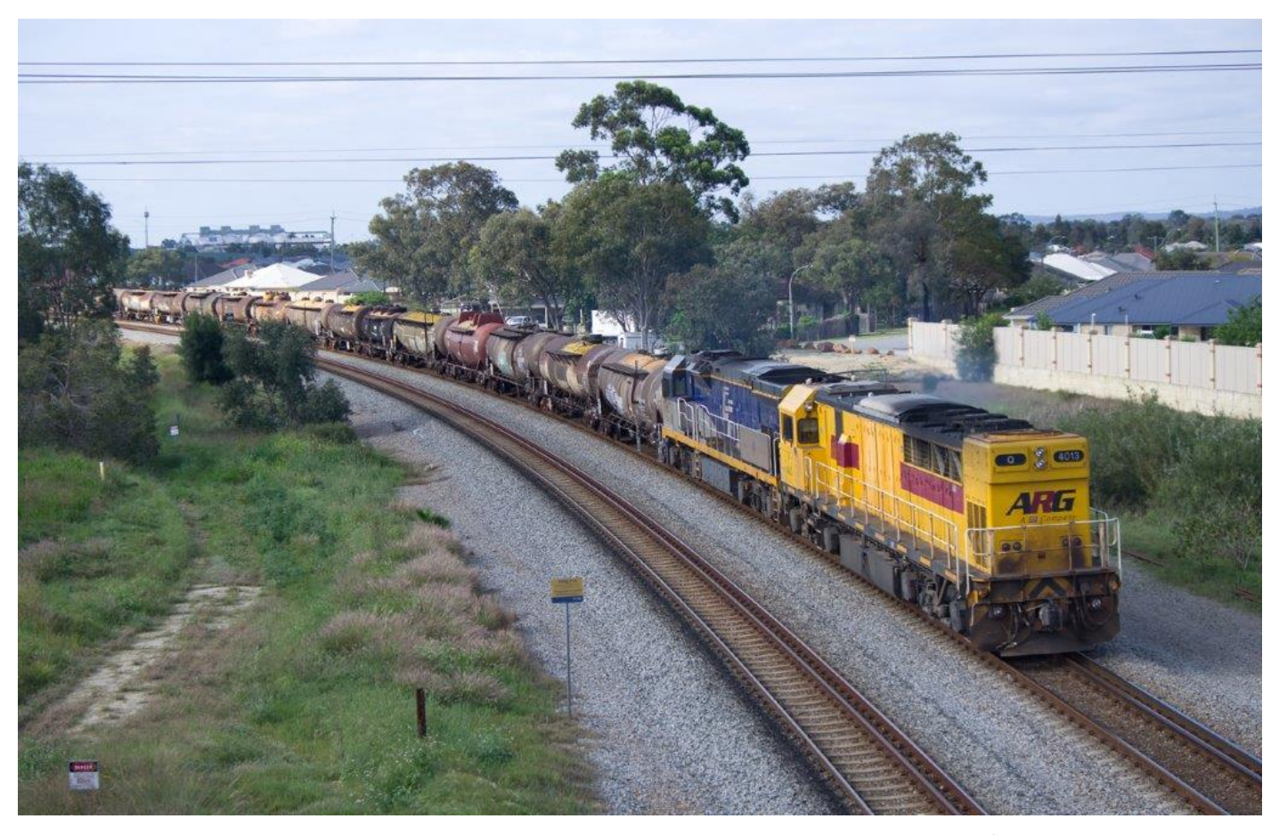
Q4013 hauls CF4407 ex workshops on 4158 Forrestfield-Kwinana BP shuttle, Welshpool, 30/9.