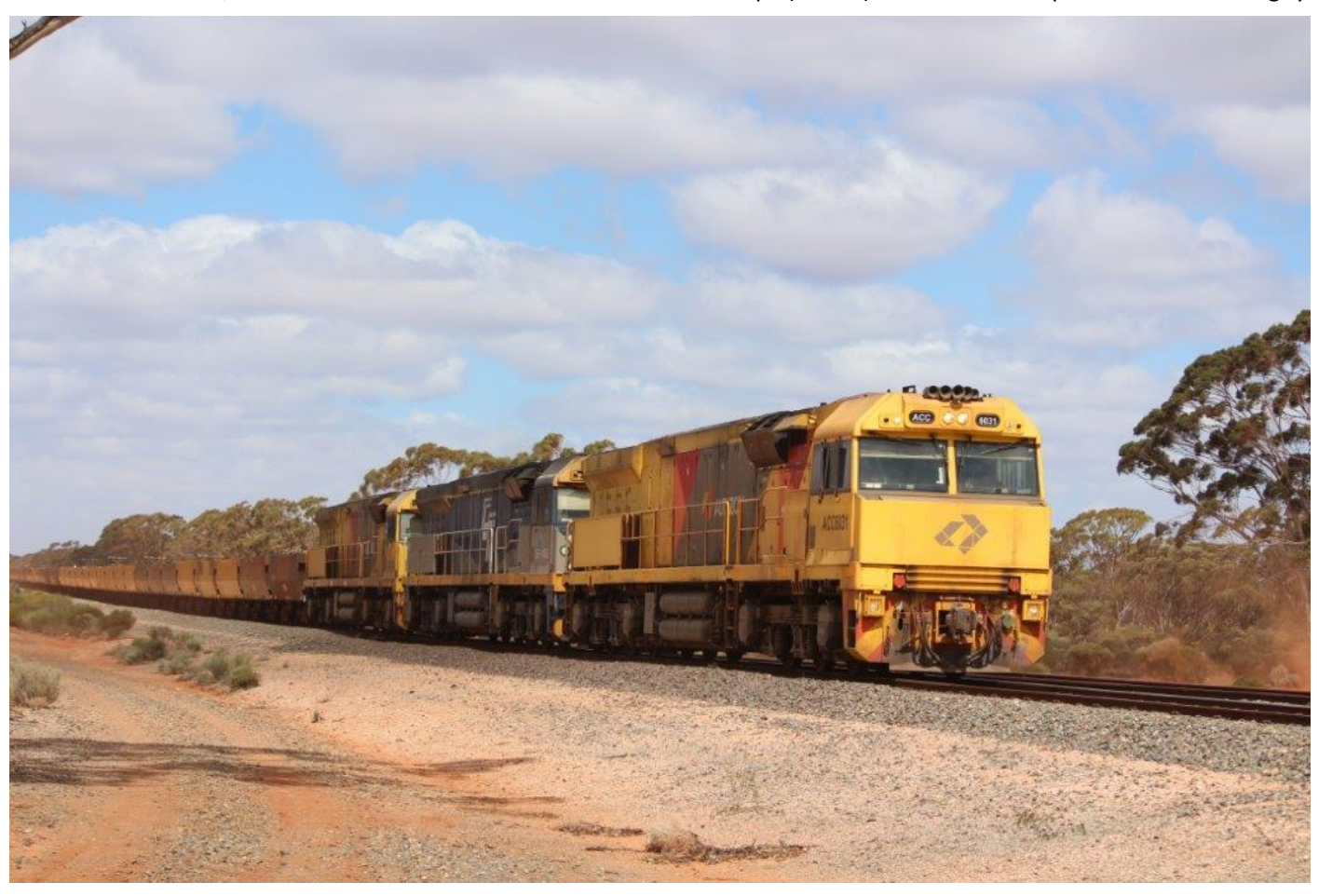
Page 16 of 31