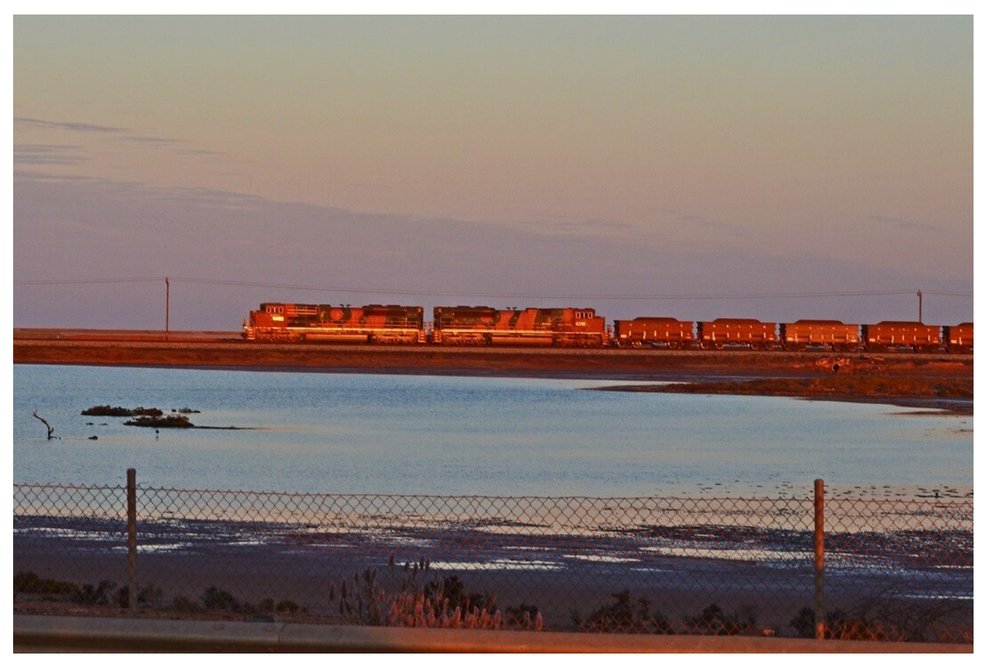
4403 & 4318 arrive at Hedland, 21st September.