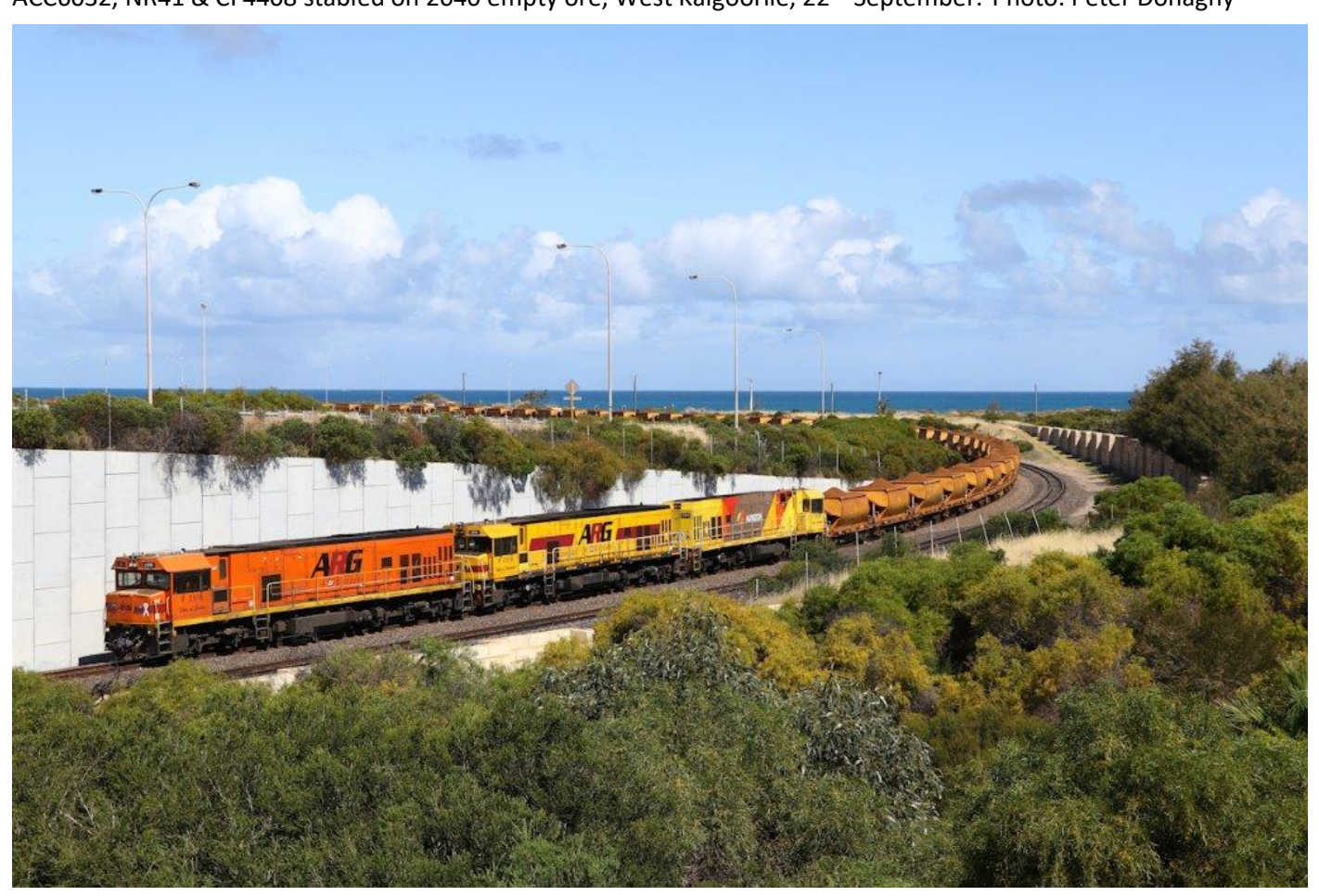
7721 loaded Mt Gibson ore eases into Geraldton Port behind Ps 2516, 2508 & 2504, 26/9.