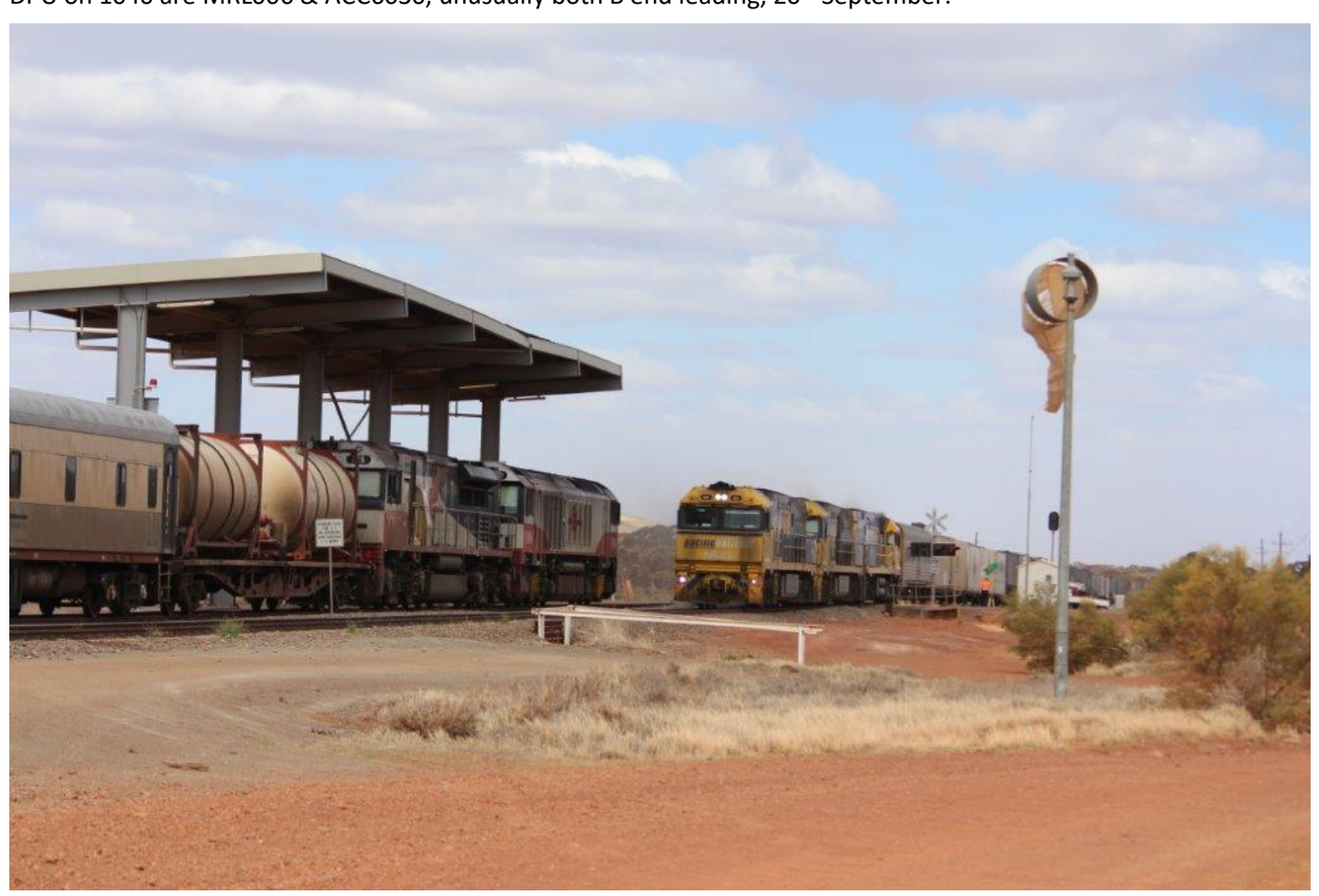
CSR006 & SCT015 on 7PA9 wait to cross NRs 43, 102 & 114 on 7MP7, Parkeston, 20/9. Page 17 of 31