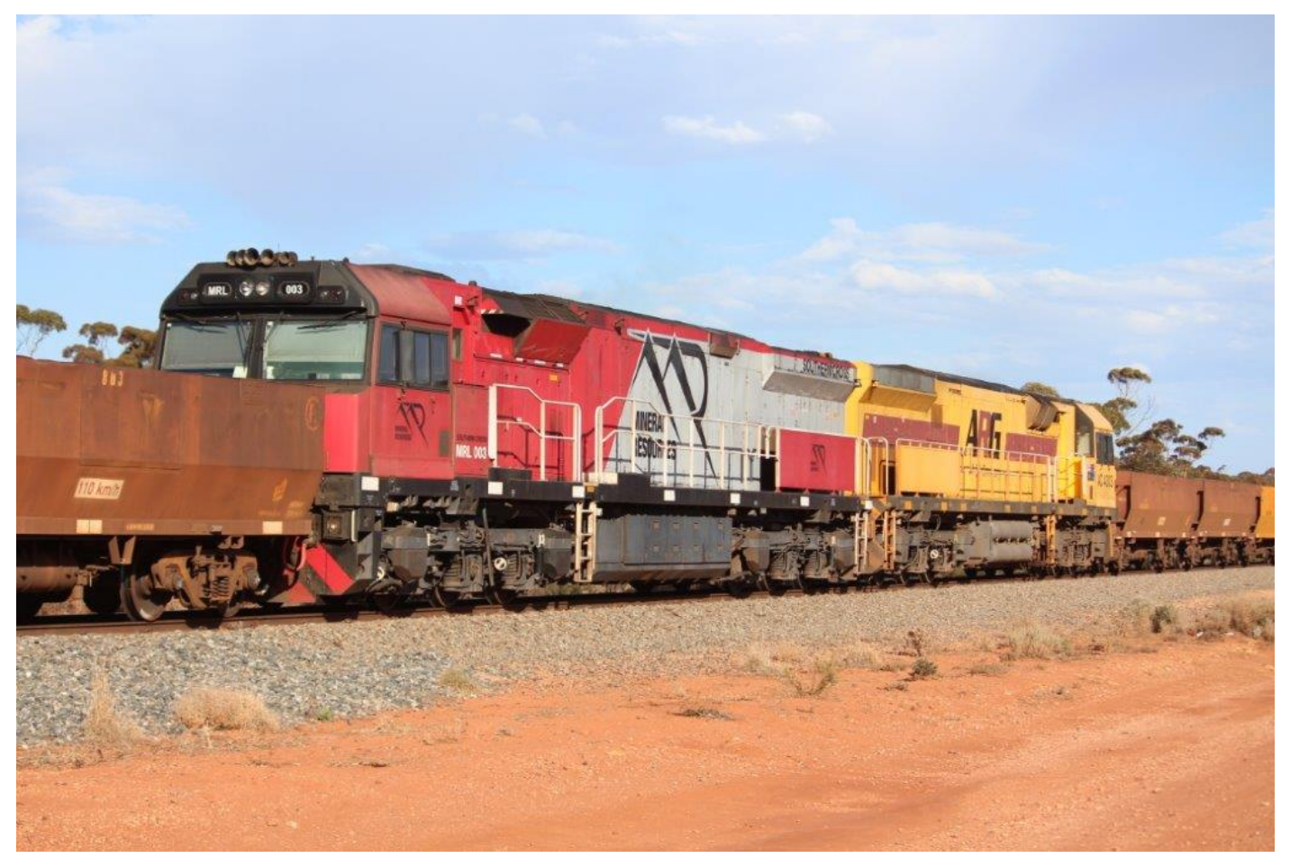
DPU on 3MR2, MRL003 & AC4303 at Binduli, 15<sup>th</sup> September.