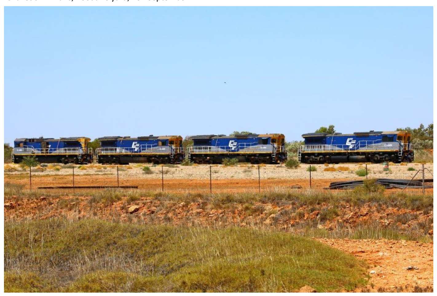
CFCLA's CM40-8Ms stored near Hedland Speedway, 28<sup>th</sup> September.