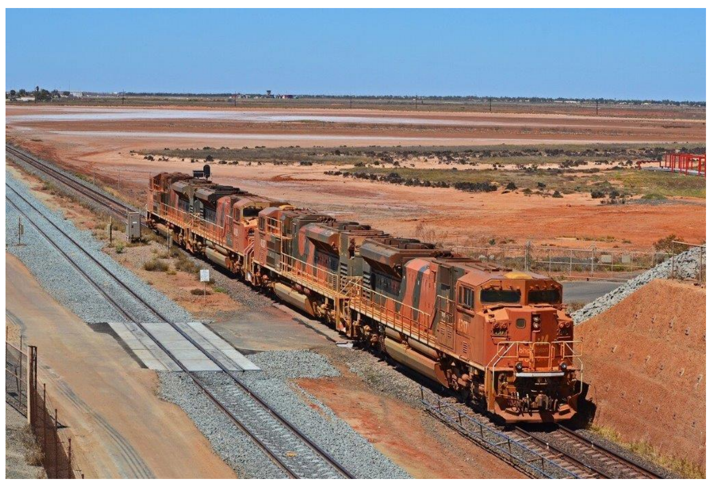
Two movements in twenty minutes from Boodarie to Nelson Point on 27<sup>th</sup> September: 4317, 4337, 4429 & 4445 light engine (above), followed by 4476 & 4327 conveying two defective hoppers (below).