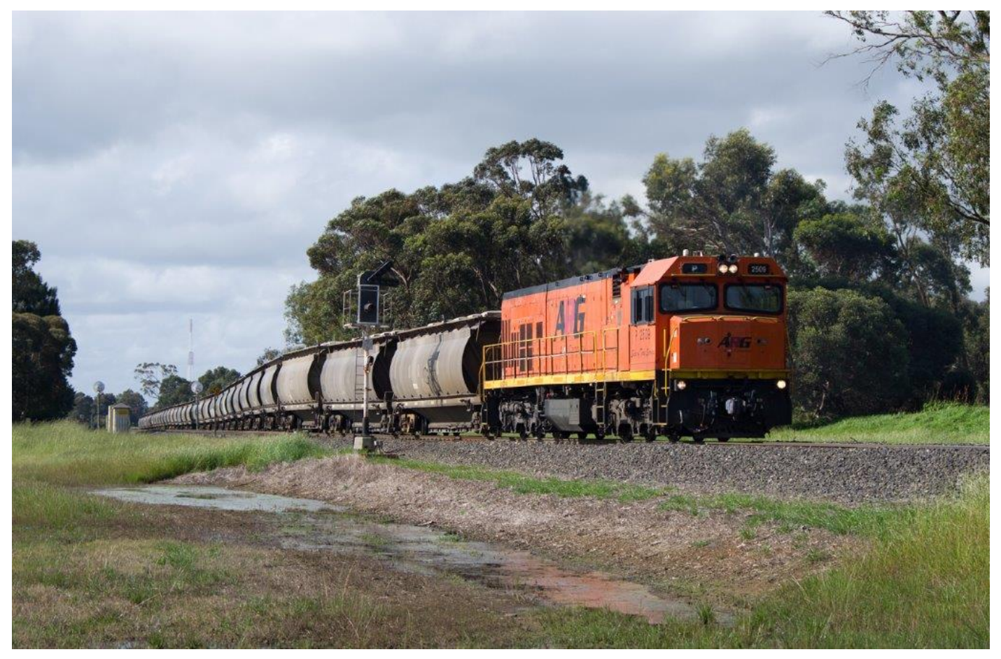
2865 passes through Brunswick Junction behind P2509, 28<sup>th</sup> September.