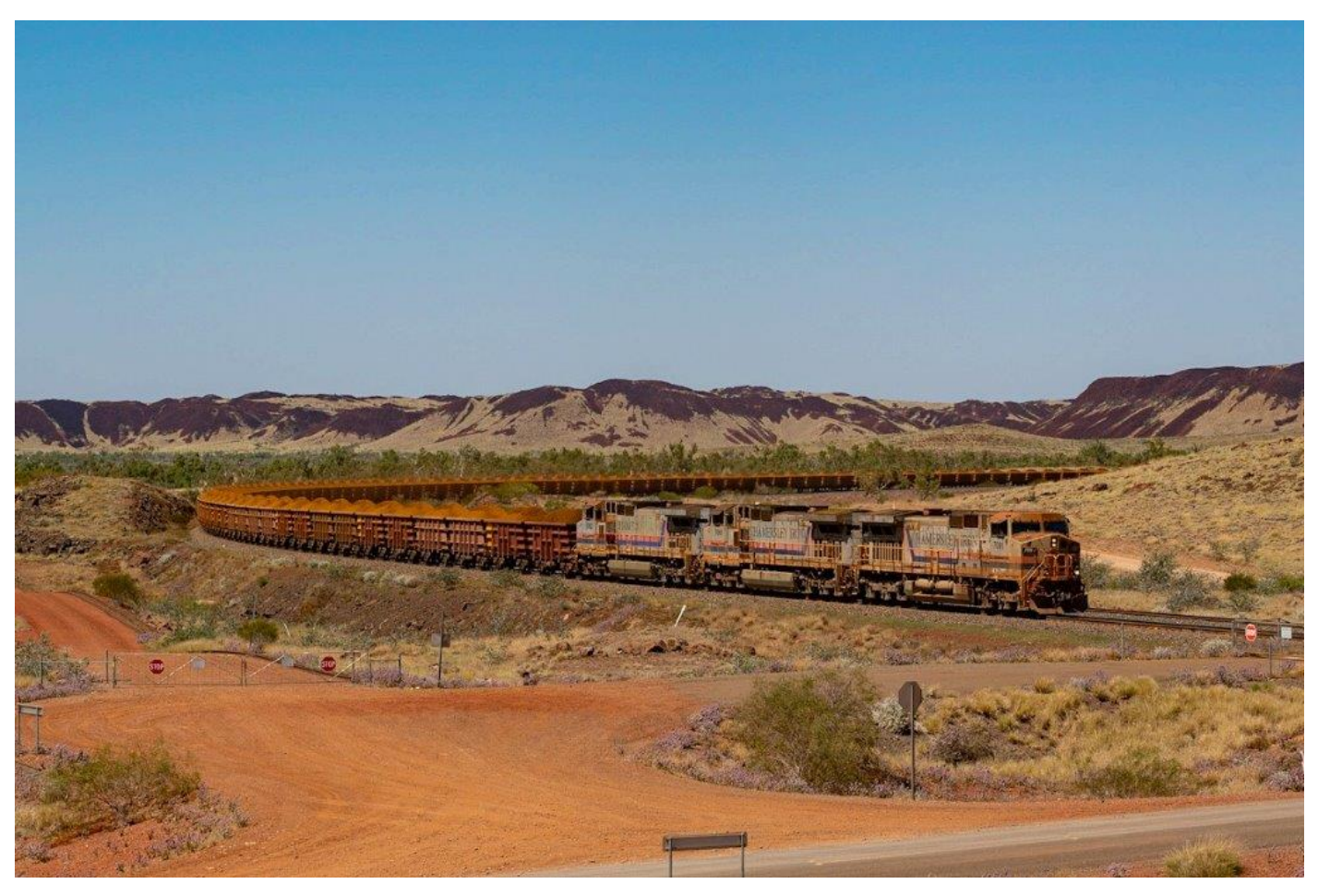
7091, 7068 & 7082 haul a load to Cape Lambert through Cooya Pooya, 14/9.