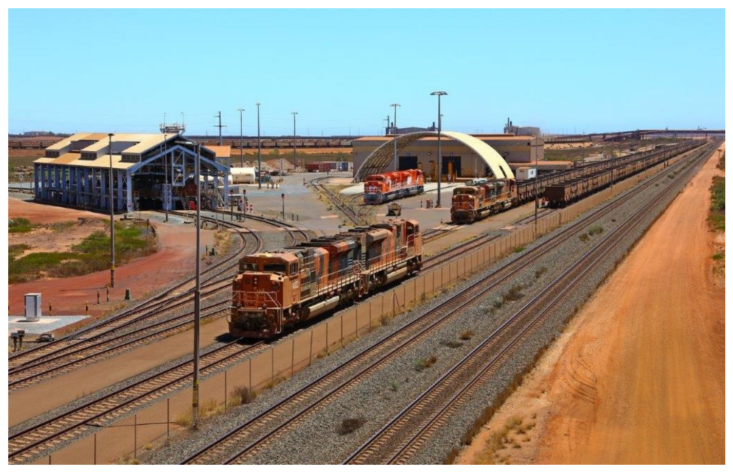
4322 & 4421 drop onto an empty rake; 4446 & 4361 await departure with empties; new 4492 & 4493 await their "shakedown" runs, Boodarie yard, 28^{th} September.