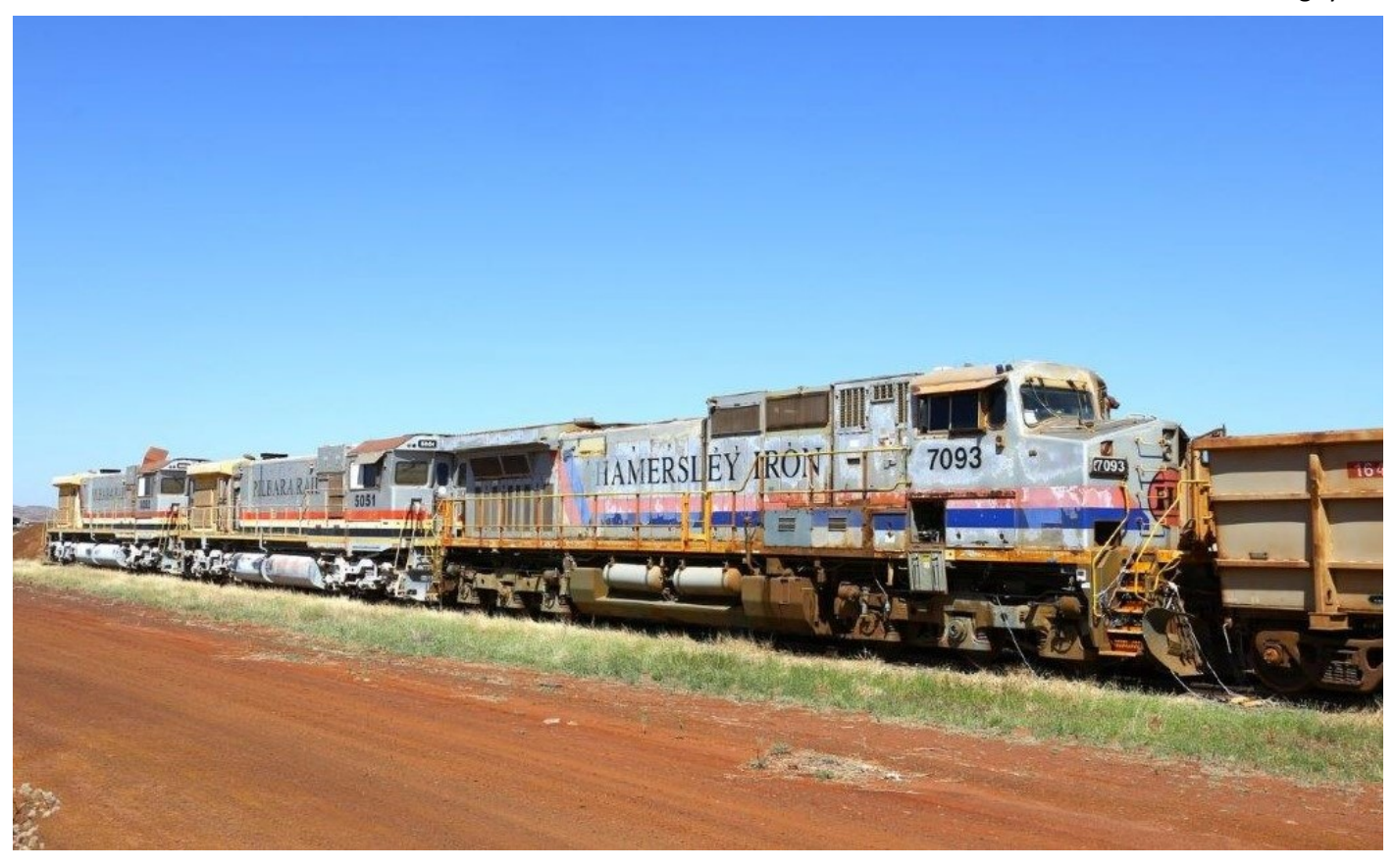
Written-off 7093 (damaged cab from a loader hit) with stored 5051 & 5052, 38 road, 7 Mile, 14<sup>th</sup> September.