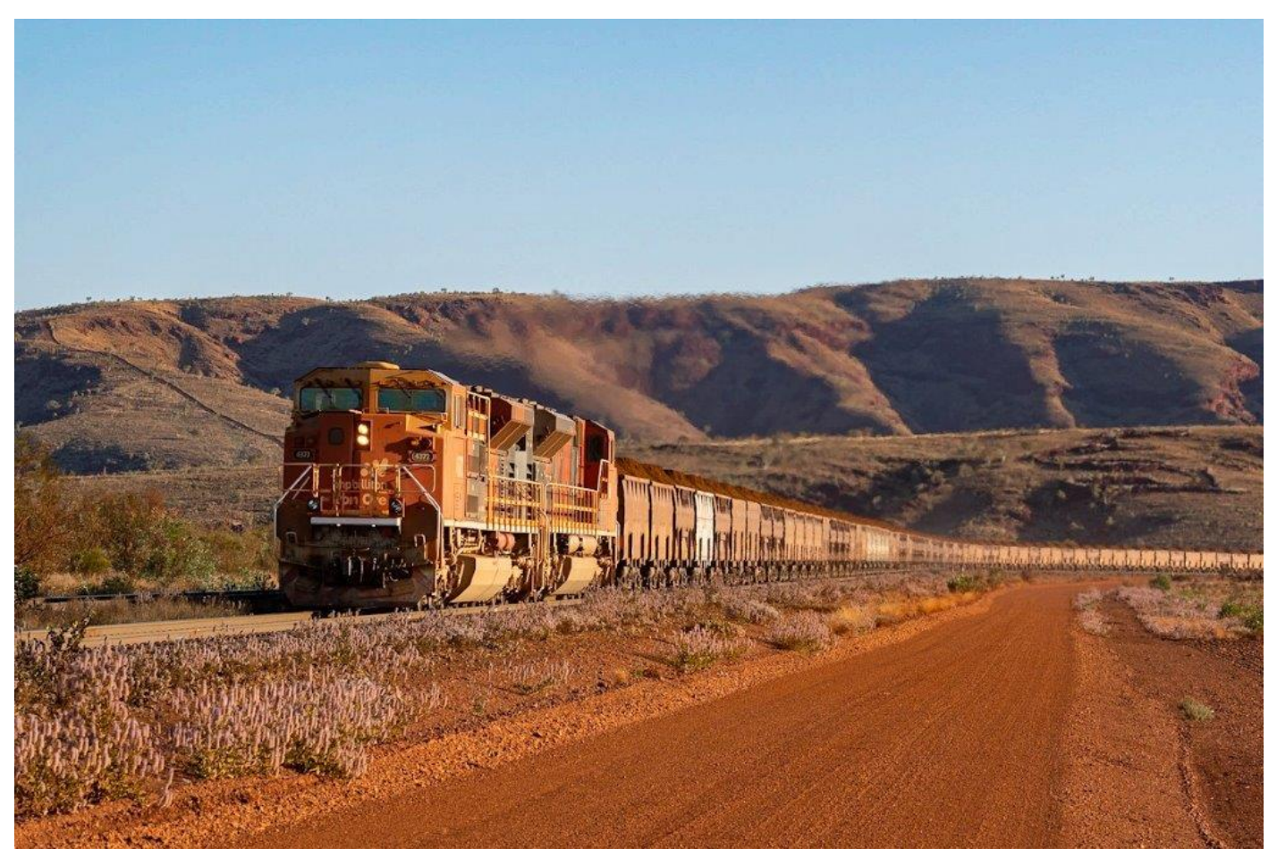
4372 & 4460 (DPU 4399 & 4360), loaded Yandi to Port Hedland, Yandi Junction, 17<sup>th</sup> September.