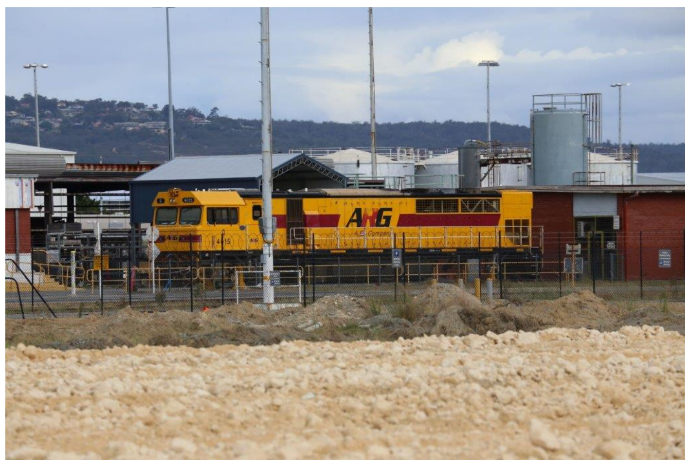
Stored Q4015, to be overhauled in 2021 after Q4018, Forrestfield, 27<sup>th</sup> September. Page 25 of 31