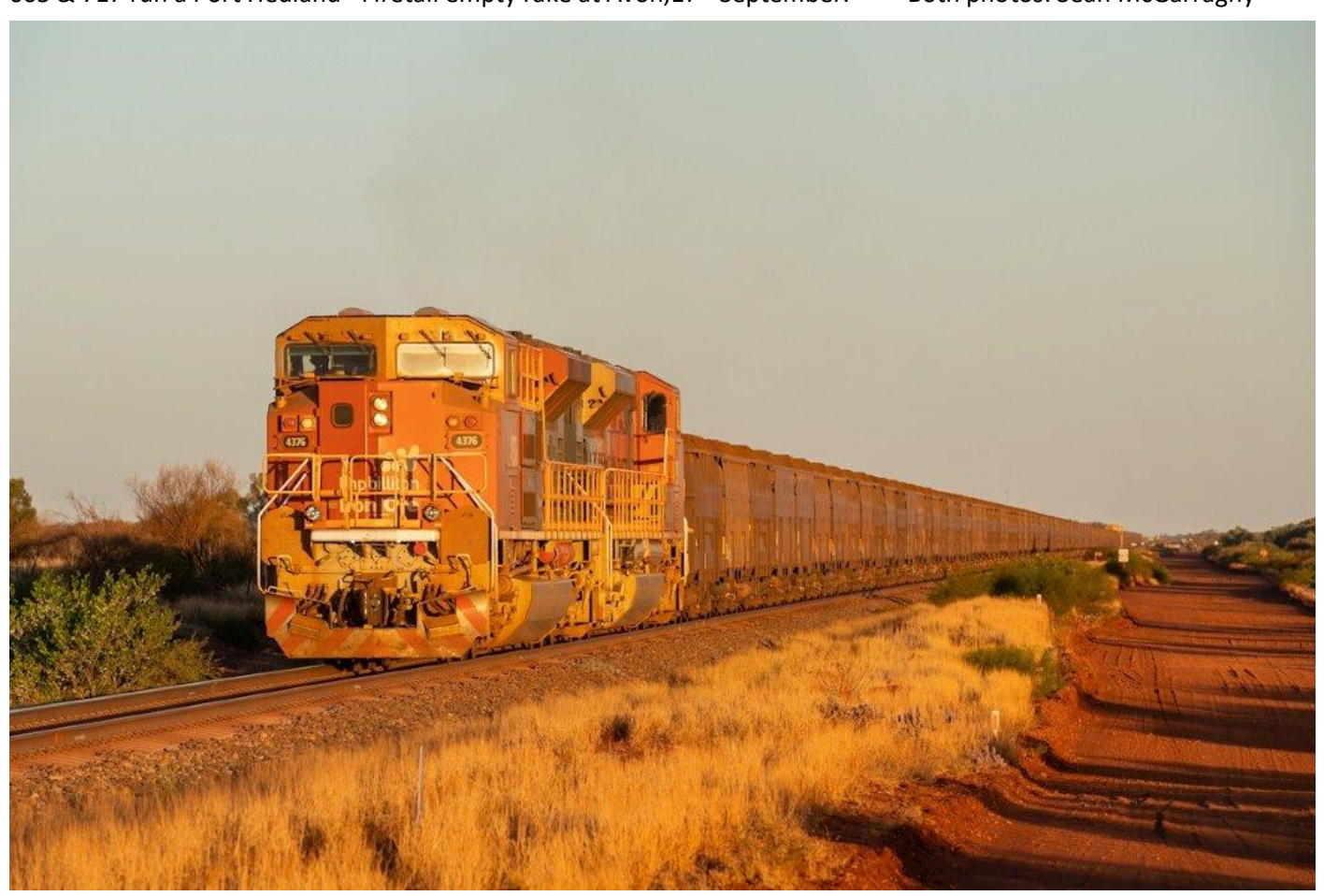
4376 & 4439 with DPU 4409 & 4405 run a load from Jimblebar to Port Hedland through Sandhill, 17^{th} September. Page 9 of 31