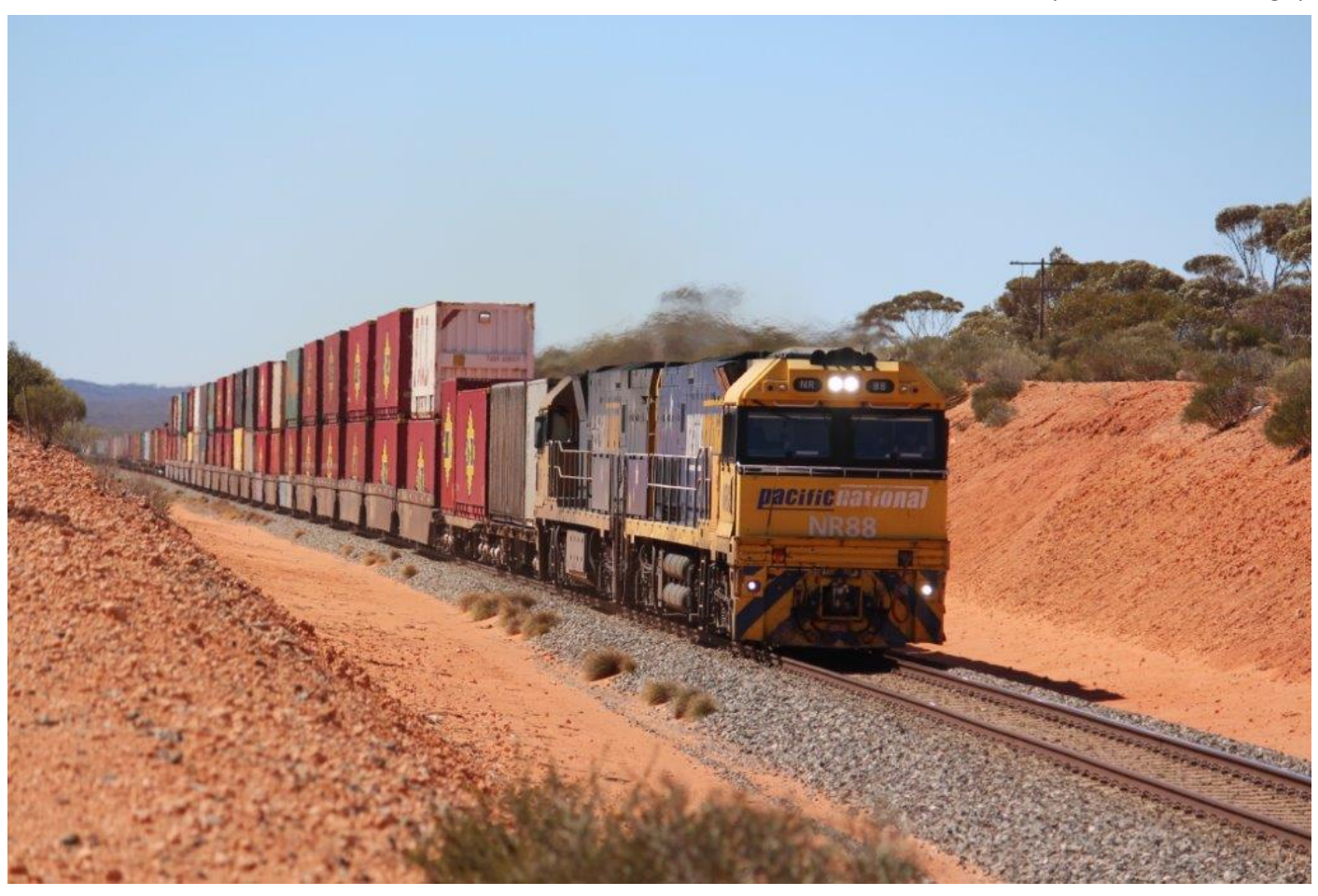
Page 14 of 31