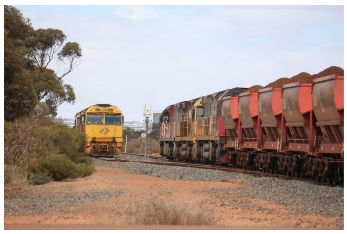
1MR1 crosses 1040 empty ore (above) at Hampton, 20<sup>th</sup> September. Then 1040 departs for Binduli behind ACC6031, CF4405 & ACB4402, to detach the ACB at Binduli for Perth workshops (below).