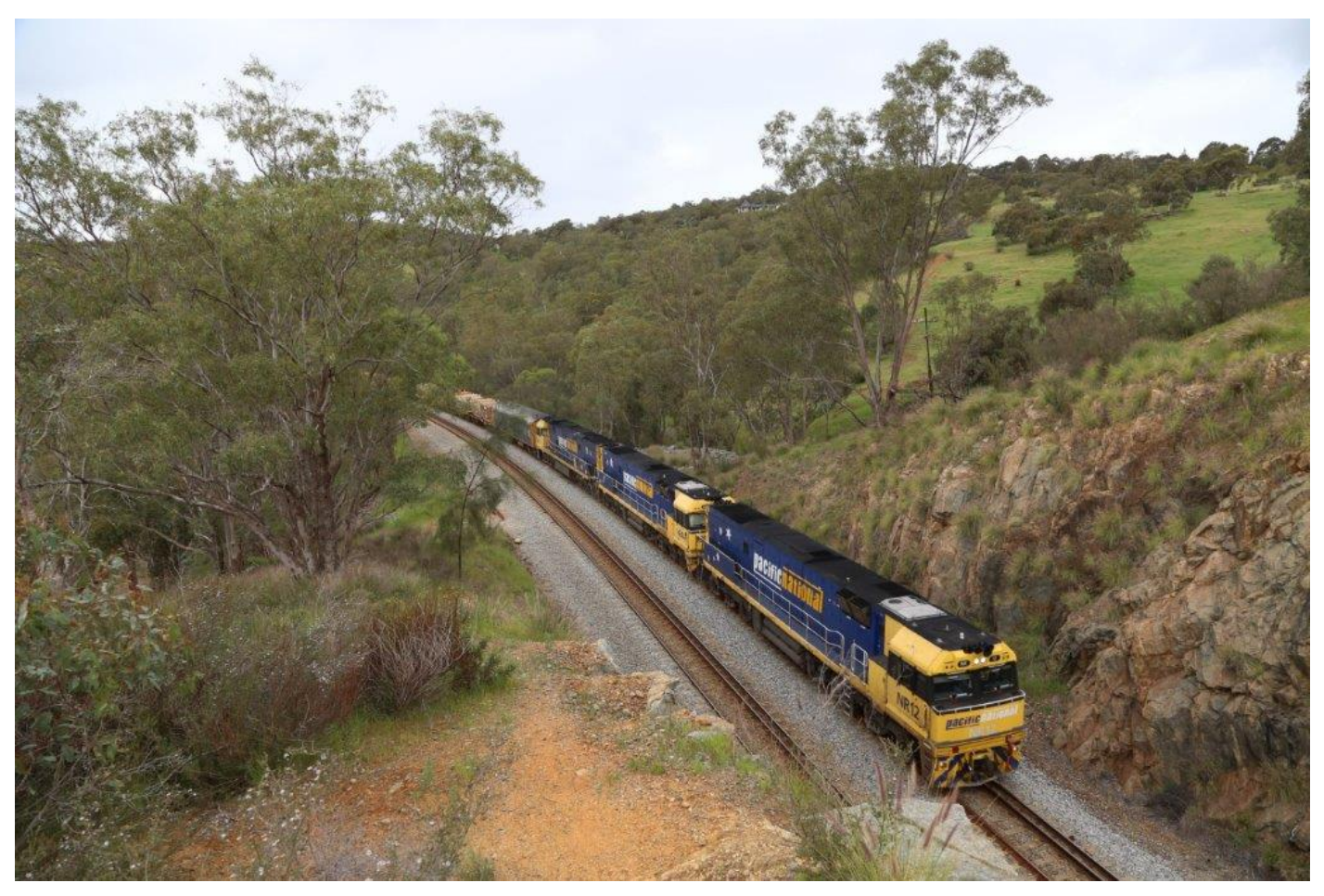
Half an hour behind 6SP5 were NRs 12, 44 & 35 on 5MP2, Bells Rapids, 27<sup>th</sup> September.