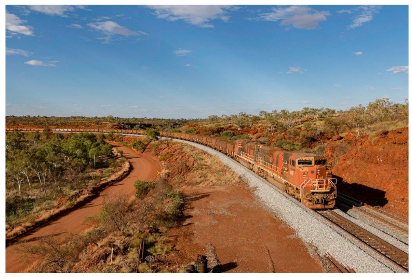
4485 & 4458 (DPU 4346 & 4413) race empty hoppers through Hesta, 15<sup>th</sup> September. Plage 7 of 31