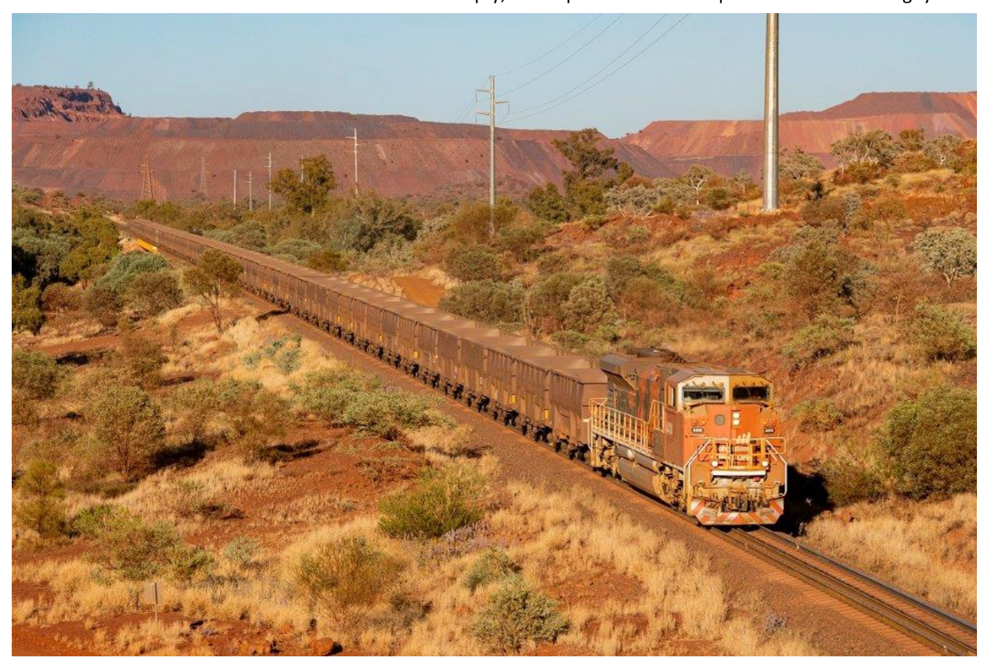
An empty rake from Mt Whaleback to Orebody 18 is led by 4414 at Newman, 18^{\rm th} September. Page 13 of 31