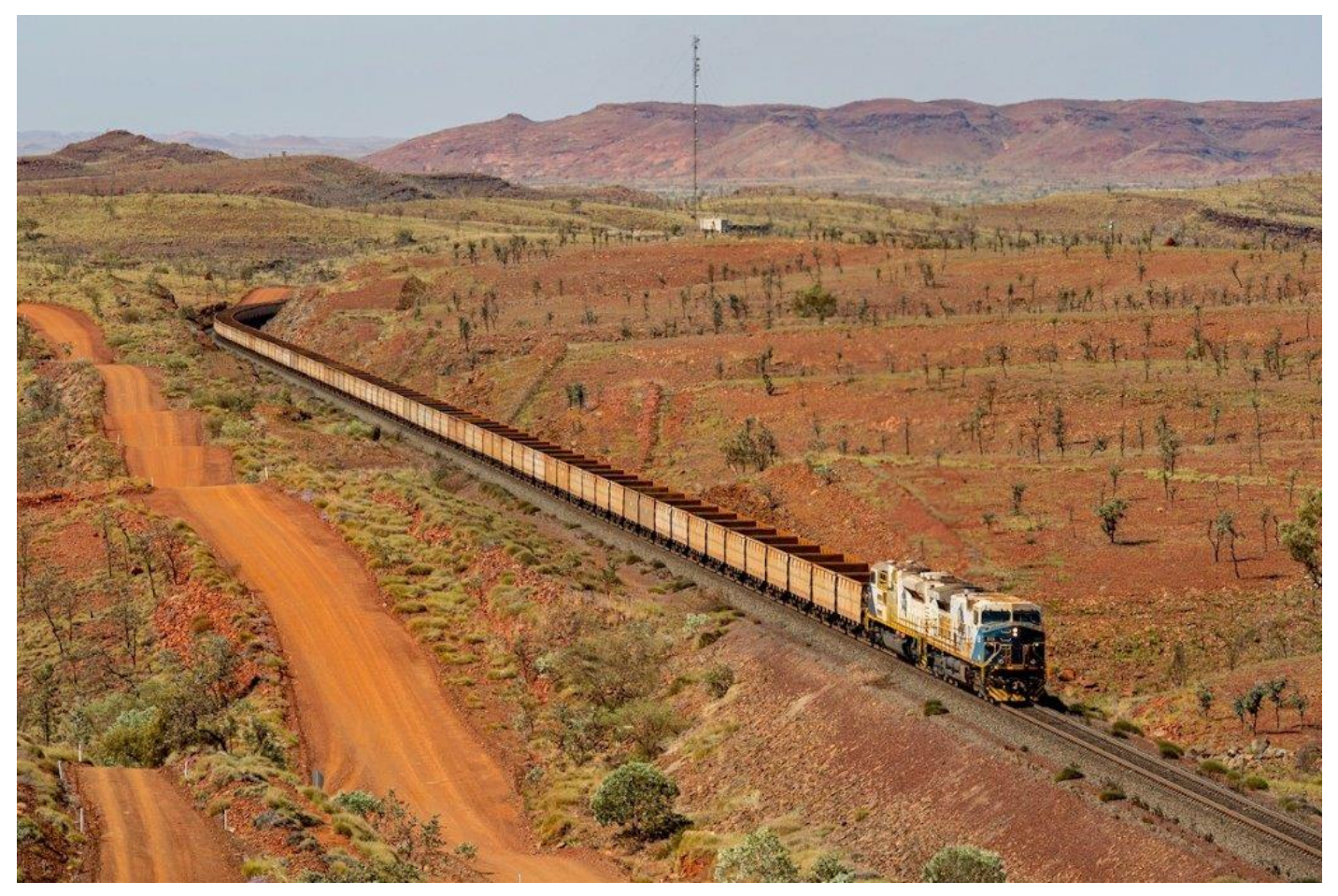
005 & 717 run a Port Hedland - Firetail empty rake at Avon,17<sup>th</sup> September.