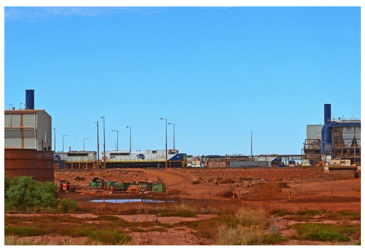
FMG's 721 & 711 at Car Dumper 1; 708 & a sister unit at Car Dumper 2, 21st September.