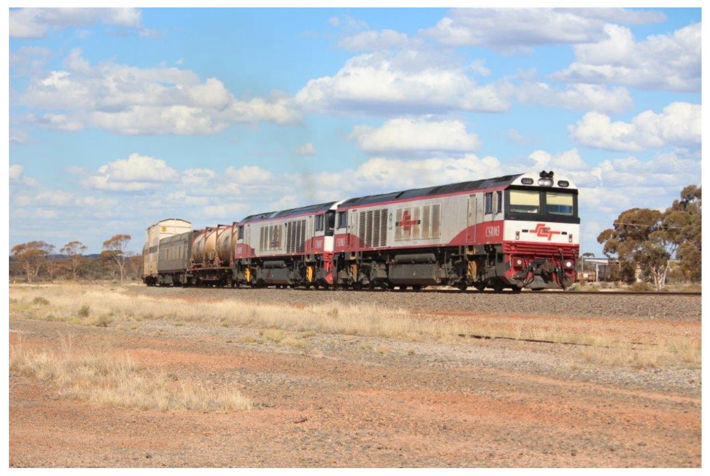
CSRs 003 & 007 depart Parkeston with 7GP1, 28^{\text{th}} September.