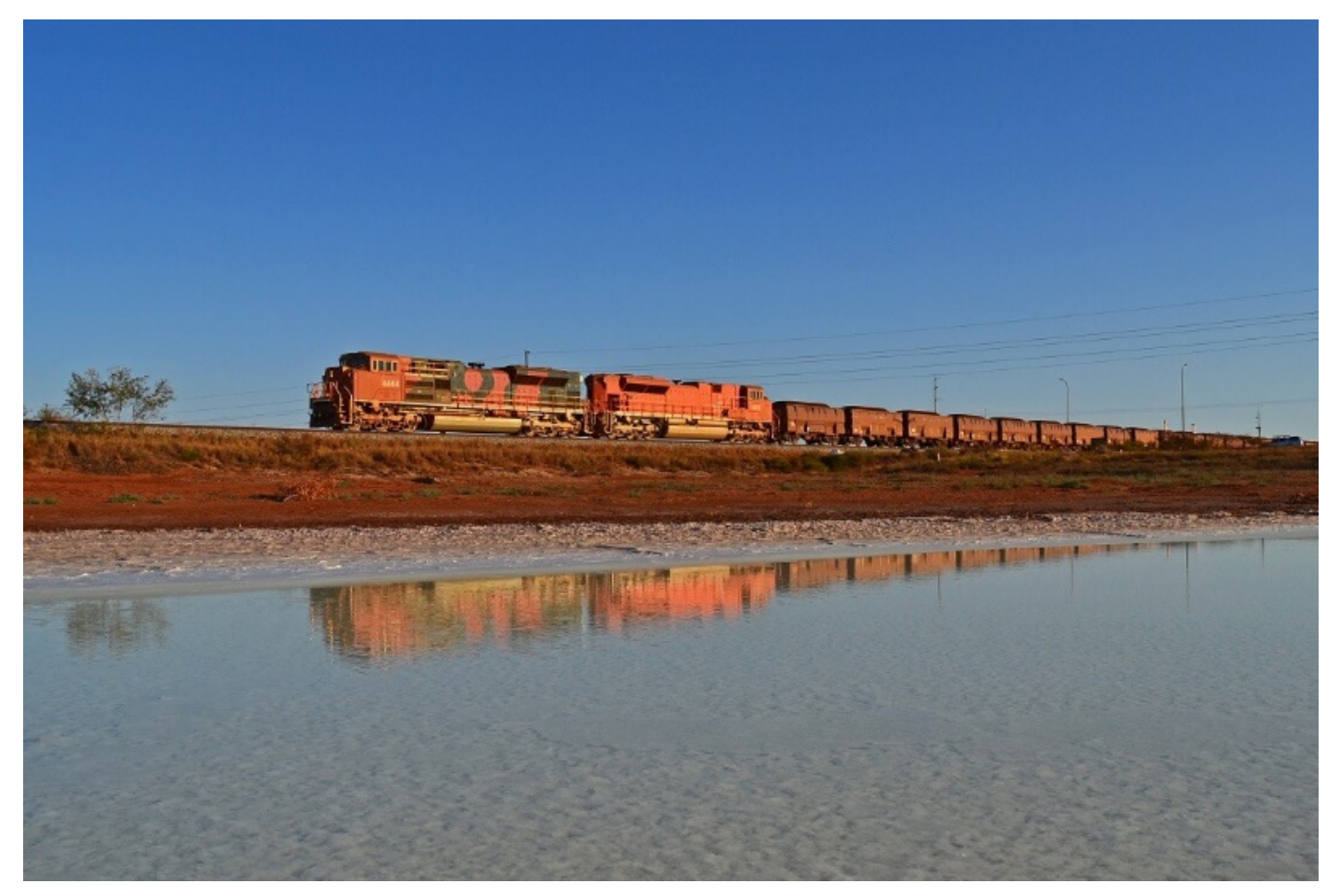
4444 & 4333 arrive at Port Hedland with a loaded ore, 27^{\text{th}} September.