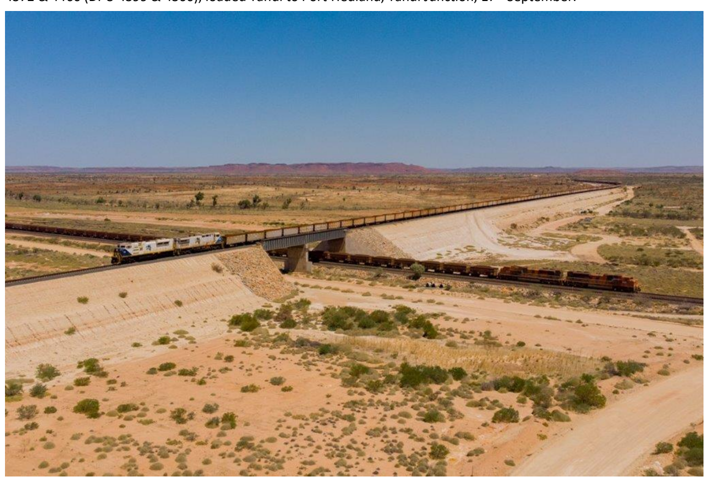
FMG's 717 & 015 ex Solomon mine cross over BHP's 4416 & 4435 at Spring, 17/9. Page 10 of 31