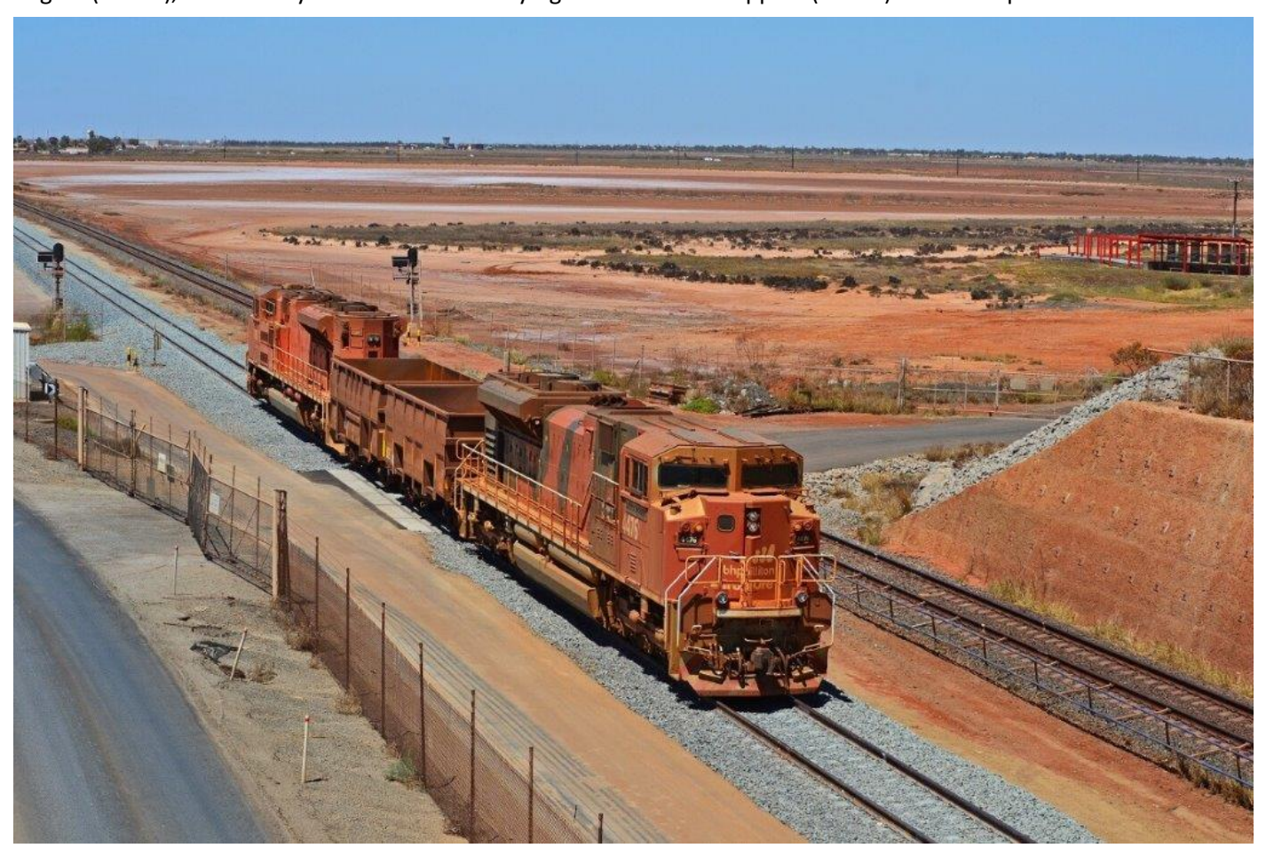
Page 21 of 31