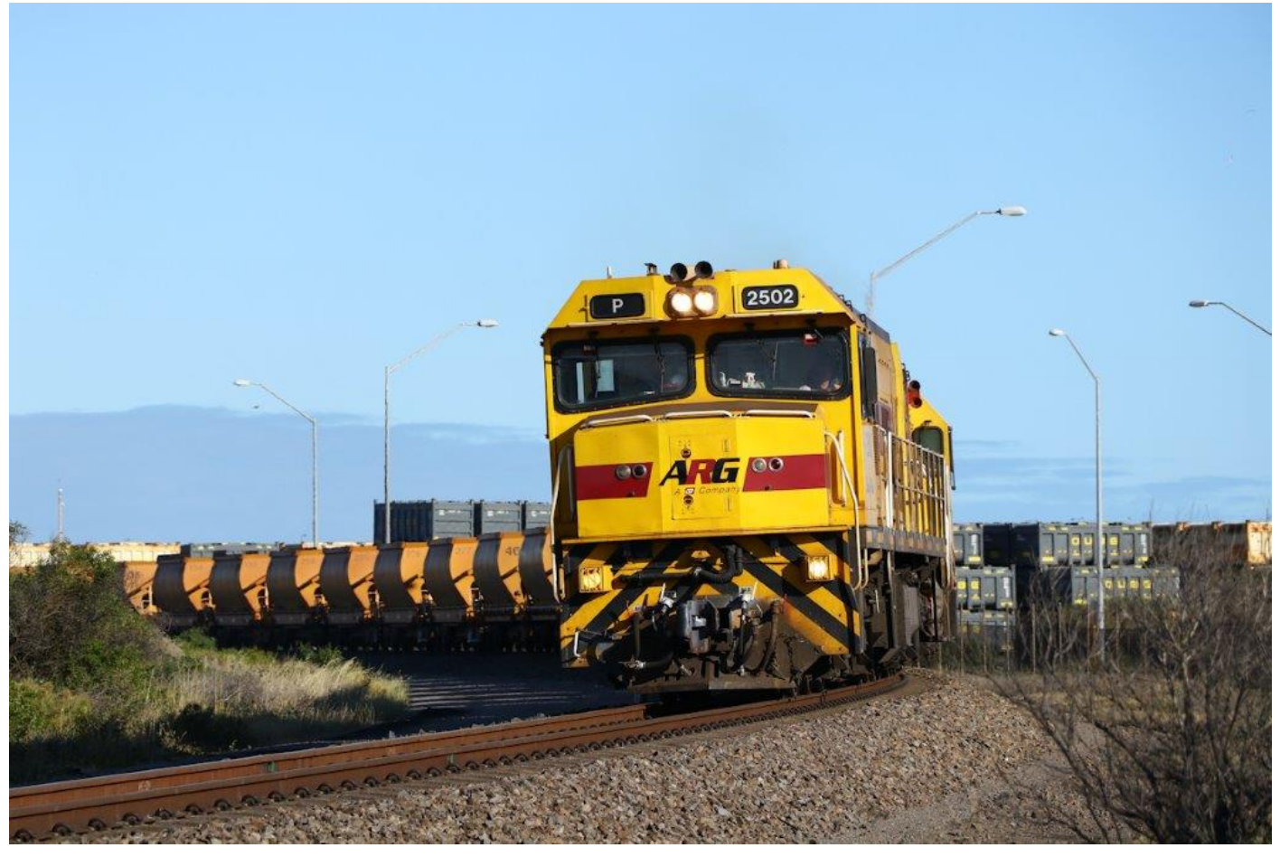
Ps 2502, 2504 & 2505 lead 3720 empty Mt Gibson ore through Beachlands, 22<sup>nd</sup> September.