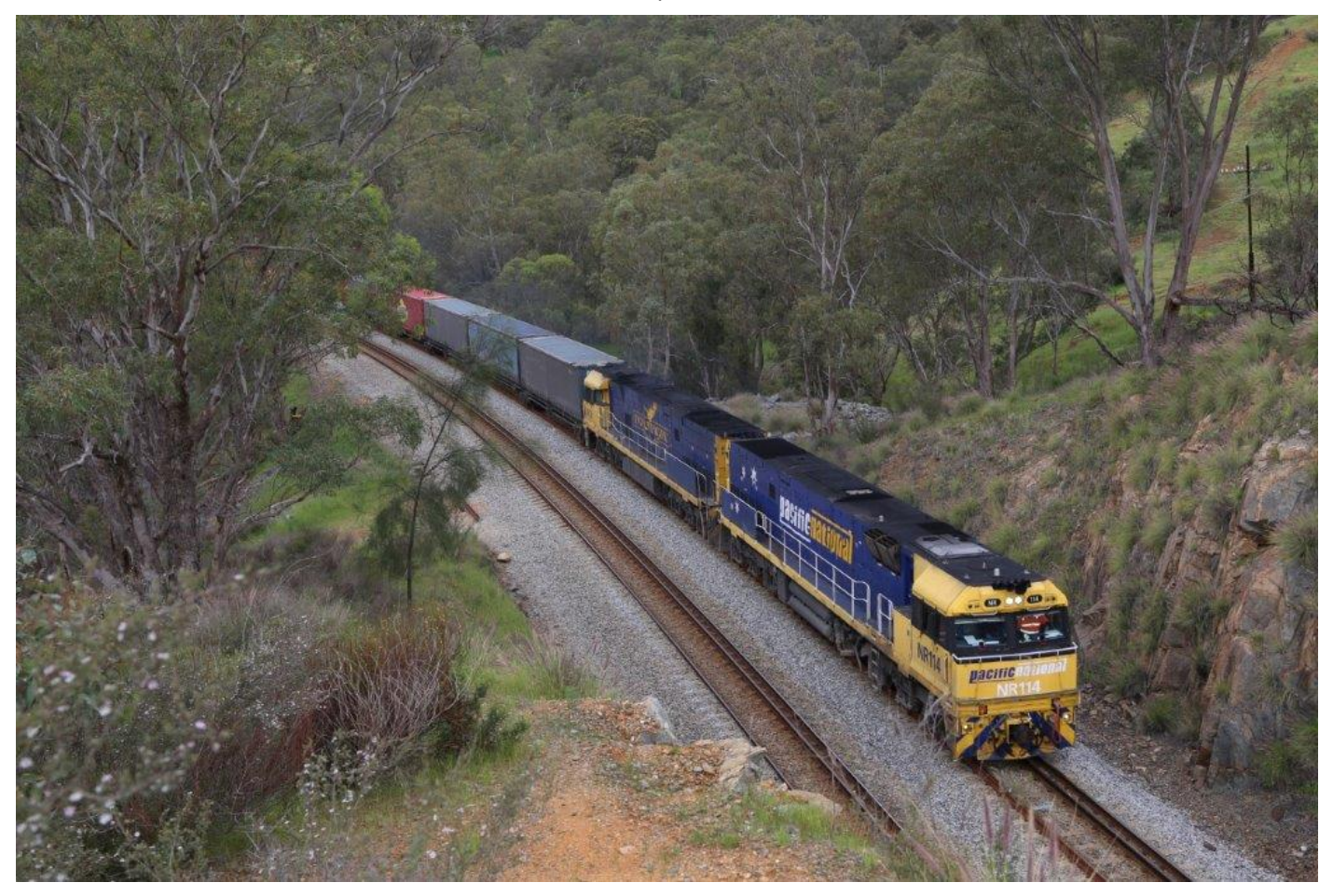
NRs 114 & 28 on 6SP5 descend through Bells Rapids, 27<sup>th</sup> September.