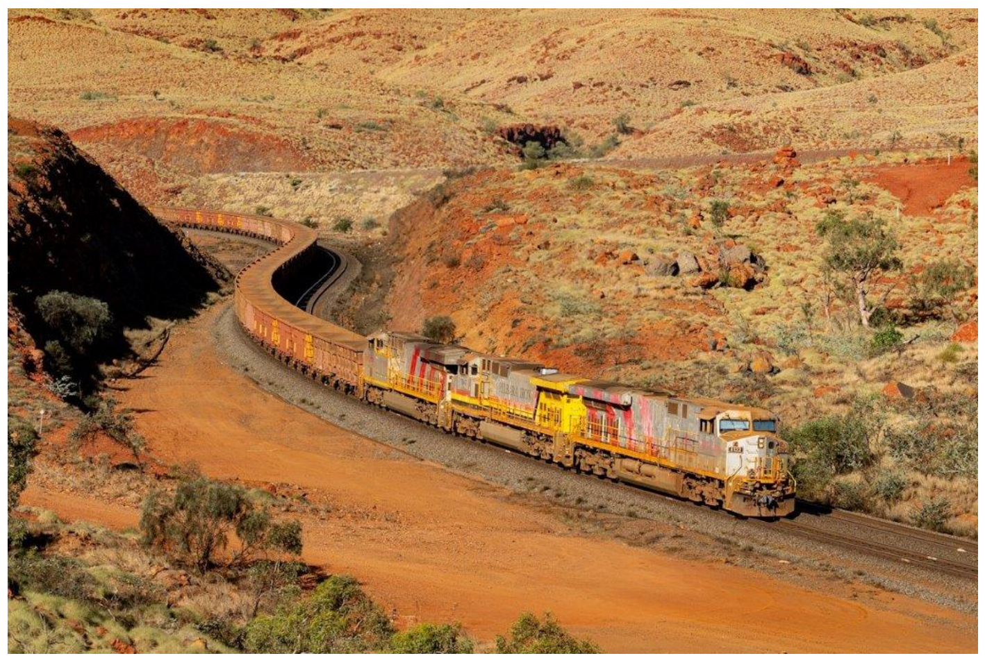
8122, 7047 & 9118 lead empties from Cape Lambert through Gecko, 13<sup>th</sup> September. Photo: Sean McGarraghy

NUMBER 9_2 A free monthly photo e-Mag of railway happenings in WA during September 2020 PUBLISHER Peter Donaghy Email: <a href="mailto:peterdonaghy2@bigpond.com">peterdonaghy2@bigpond.com</a> Copyright: Peter Donaghy © 2020