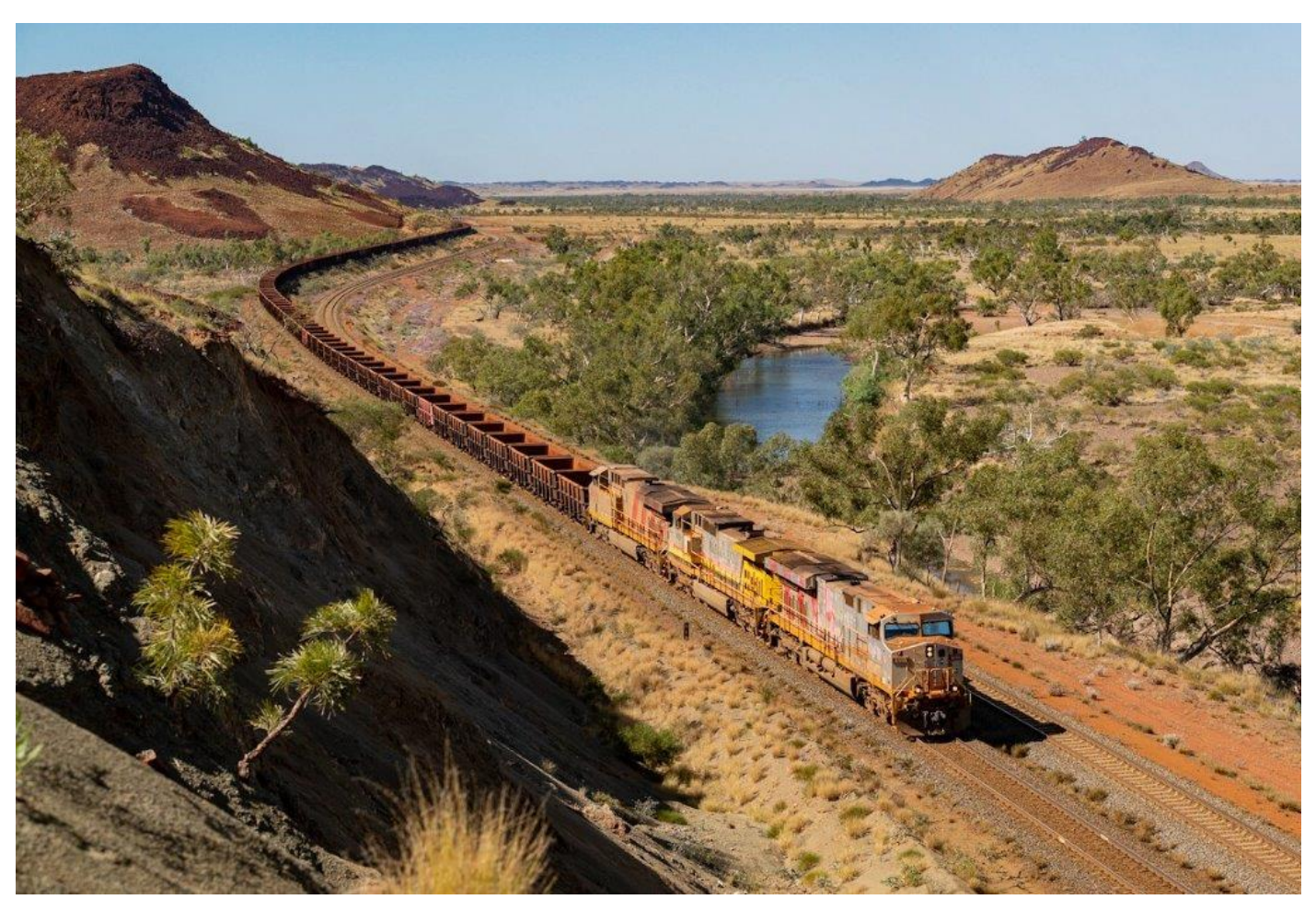
8146, 9429 & 9135 work a rake of empties from Cape Lambert, Jacob's Gully, 14/9.