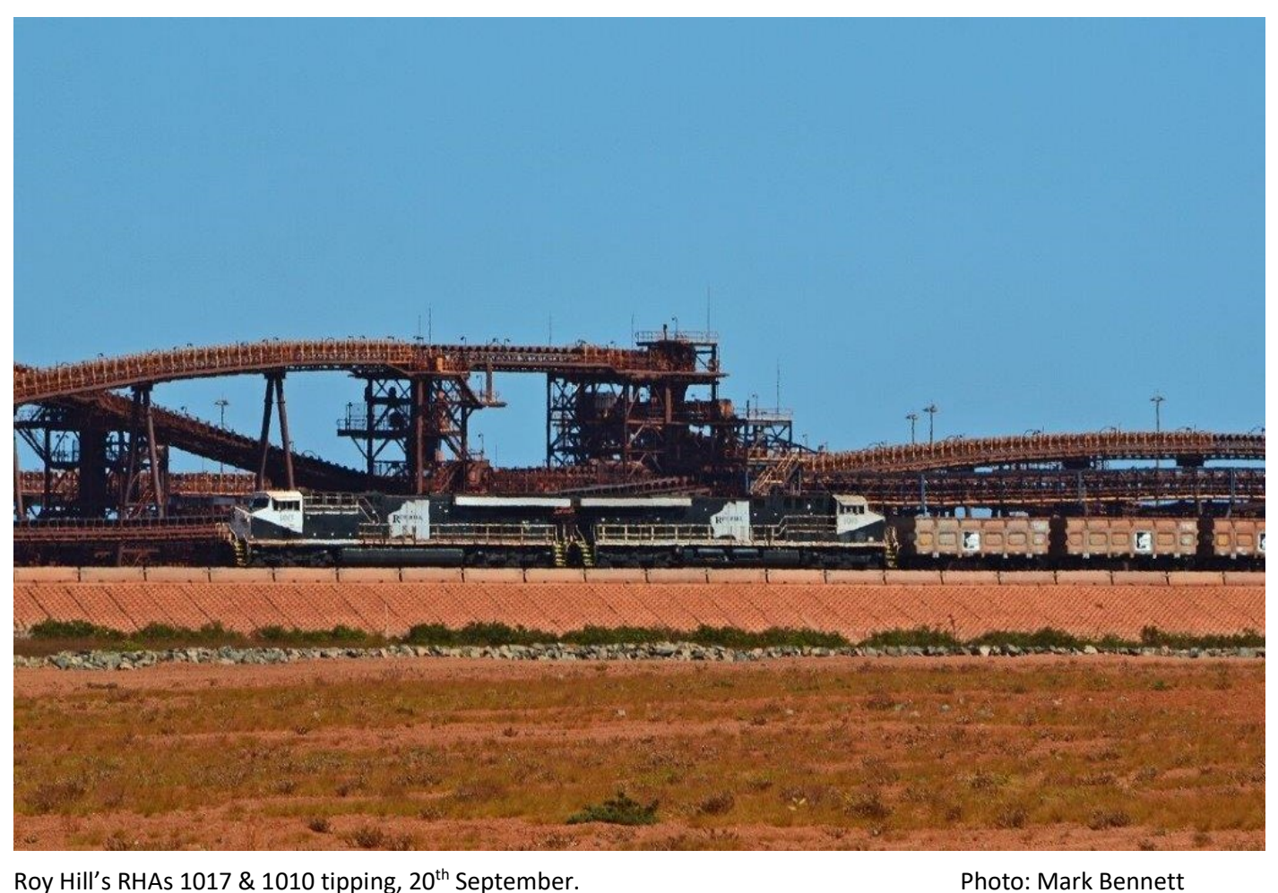
Roy Hill's RHAs 1017 & 1010 tipping, 20<sup>th</sup> September.