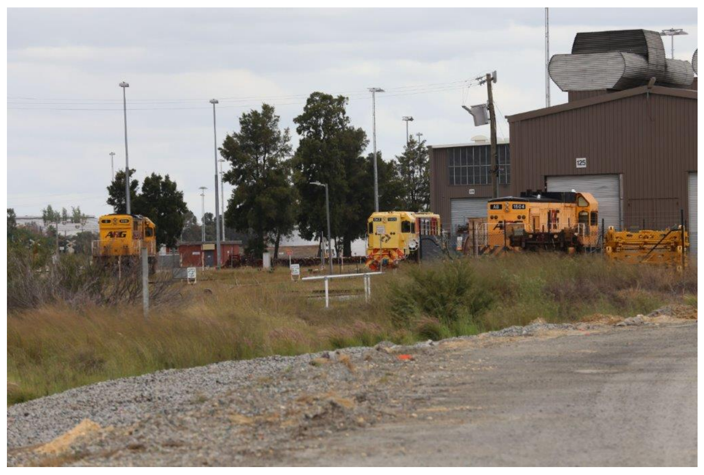
Q4010, DAZ1901 & AB1504 at Gemco Forrestfield, 27<sup>th</sup> September.