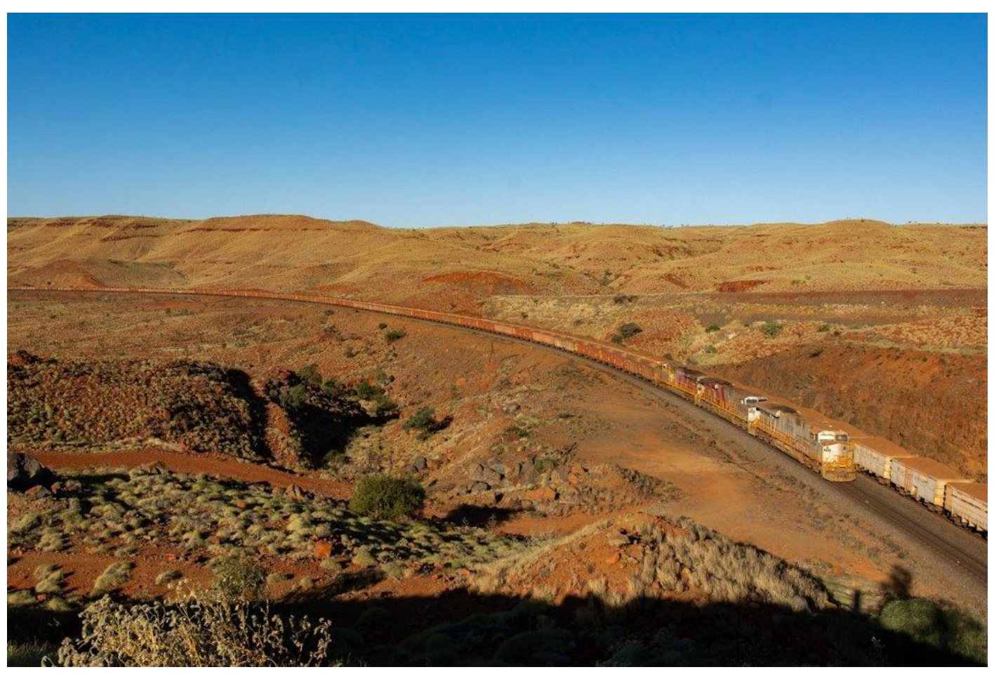
Another load of empties from Cape Lambert passes through Gecko, led by 8104, 9144 & 8135, 13<sup>th</sup> September.