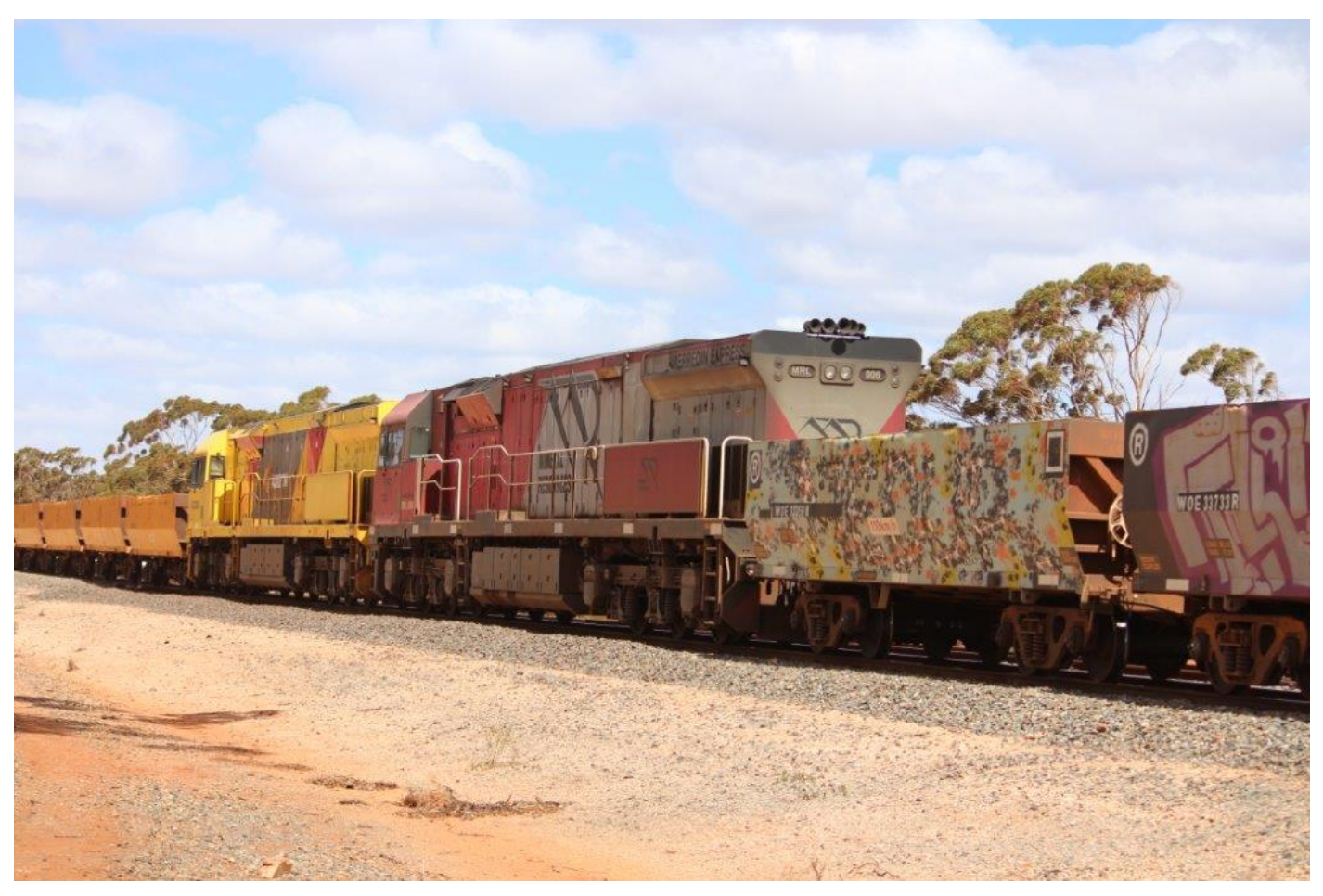
DPU on 1040 are MRL006 & ACC6030, unusually both B end leading, 20<sup>th</sup> September.