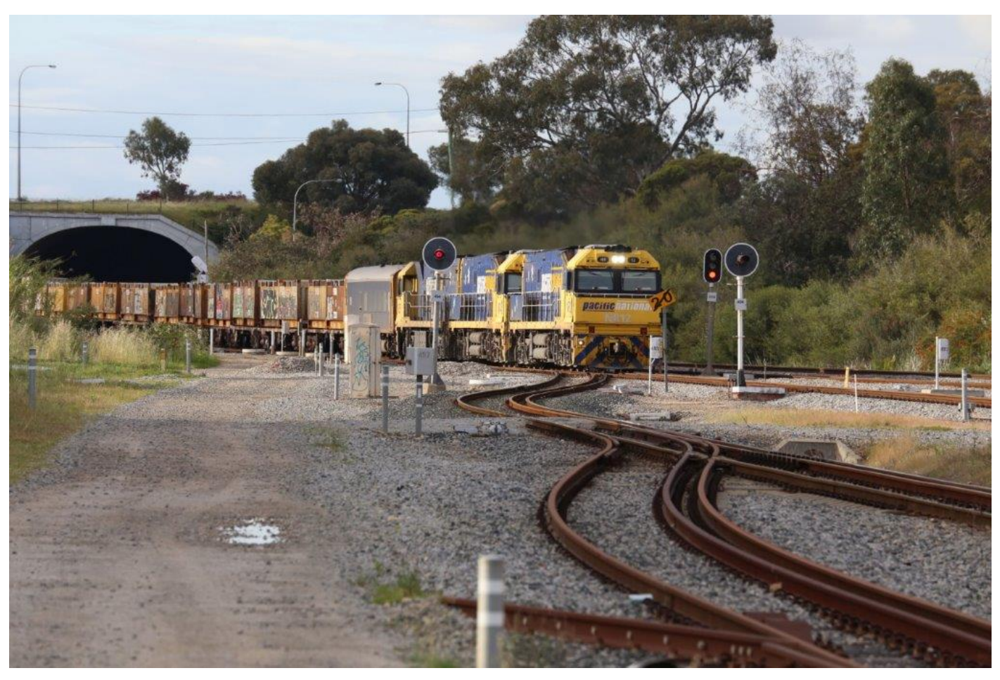
5MP2 enters Forrestfield behind NRs 12, 44 & 35, 27<sup>th</sup> September.