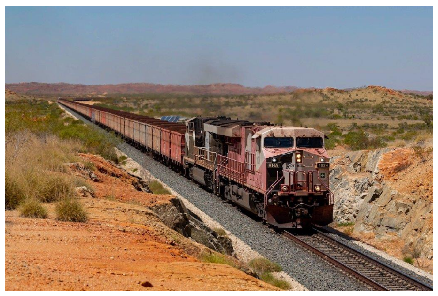
RHAs 1024 & 1021 (DPU 1018 & 1020), loaded ore from Roy Hill, Coonarie, 17/9.