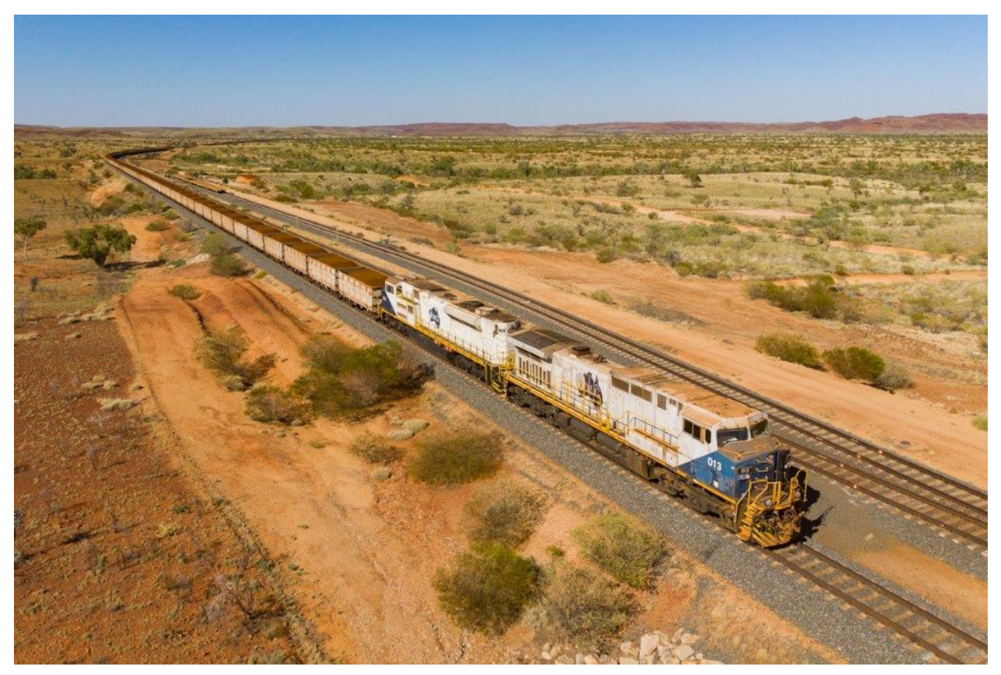
013 & 708 on a loaded train held at Avon to cross an empty, 17<sup>th</sup> September.