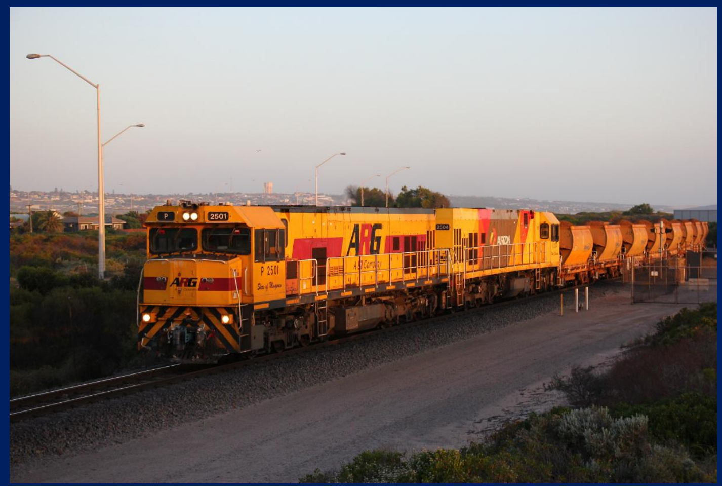
P2501 & P2504 on 4721 Mt Gibson ore at Beachlands November 1st.