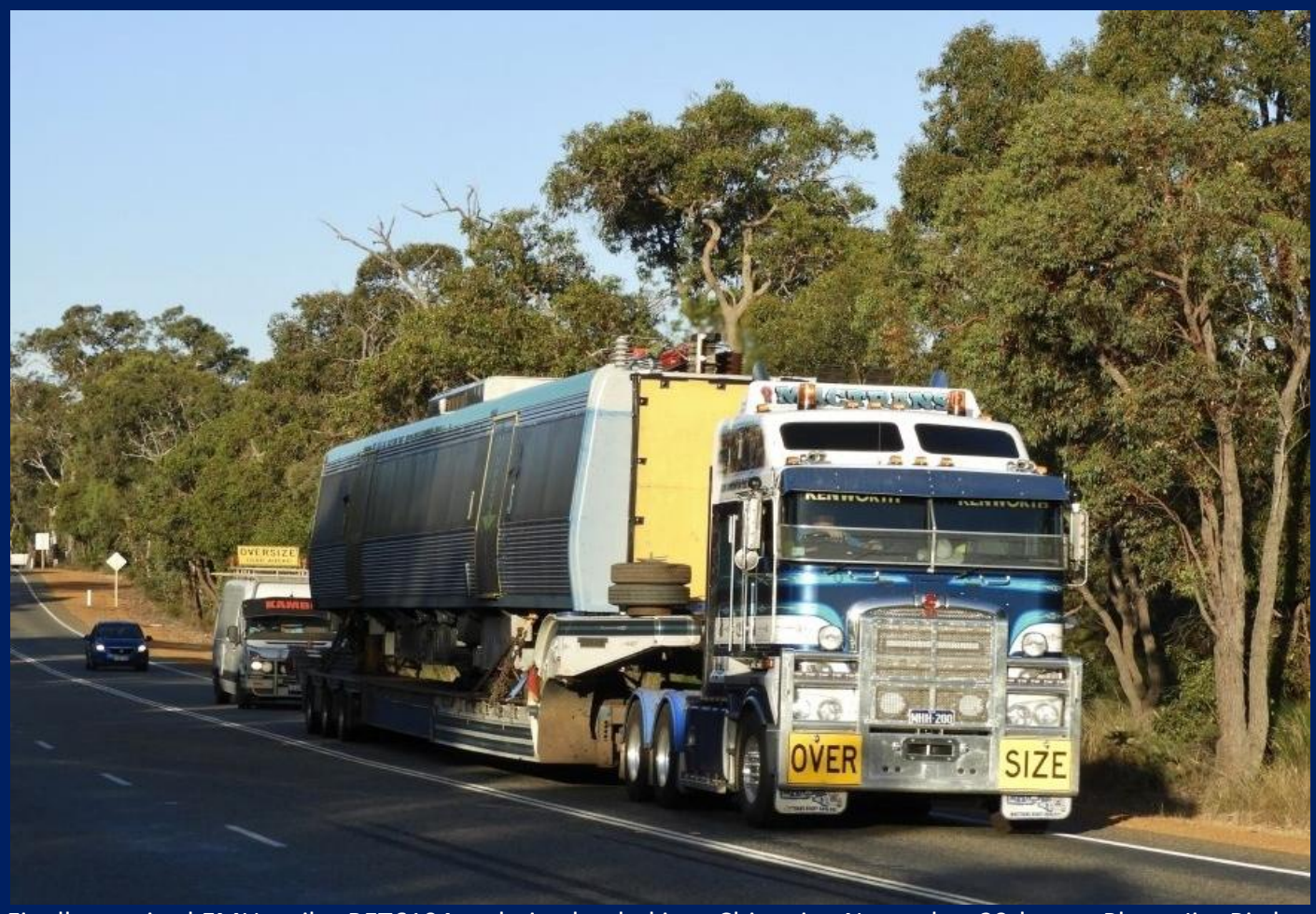
Finally repaired EMU trailer BET6104 on being hauled into Chittering November 29th.