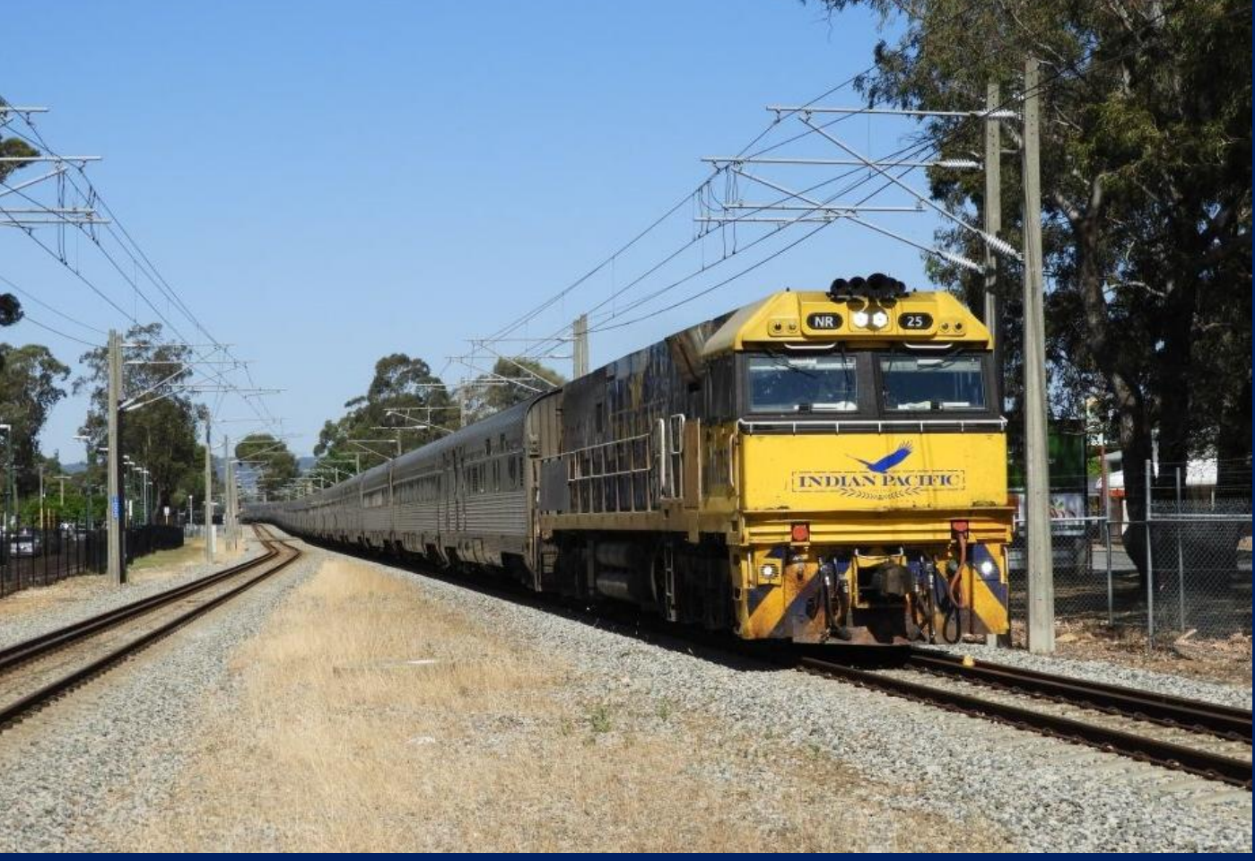
NR25 on 5AP8 Indian Pacific under the wires at Guildford November 25th.