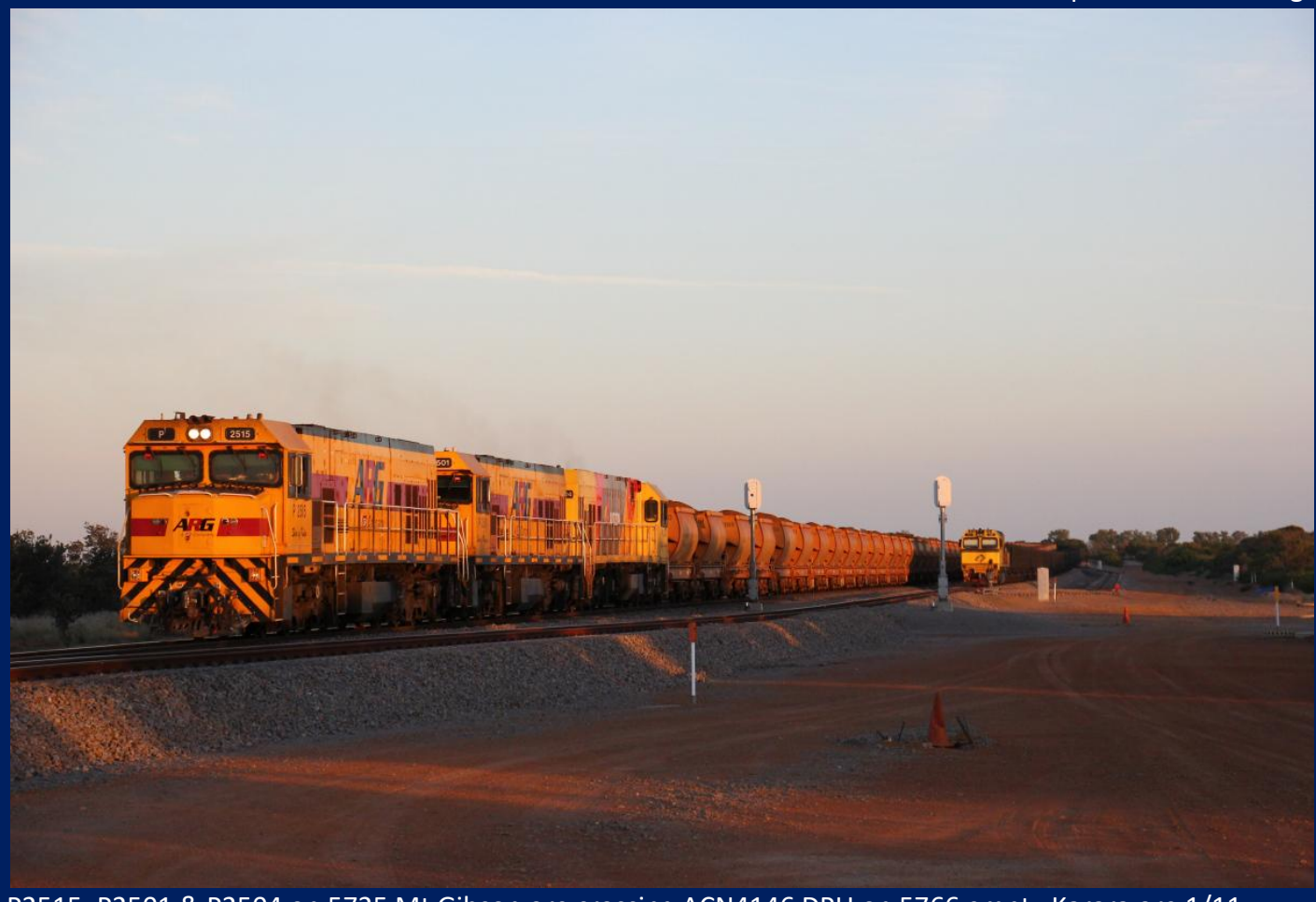
P2515, P2501 & P2504 on 5725 Mt Gibson ore crossing ACN4146 DPU on 5766 empty Karara ore 1/11.