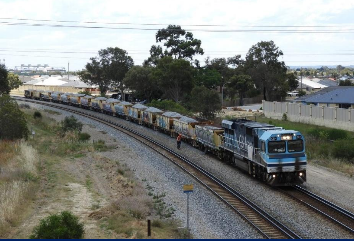
CBH007 on 7BT2 Watco ballast spot ballasting Wattle Grove November 11th.