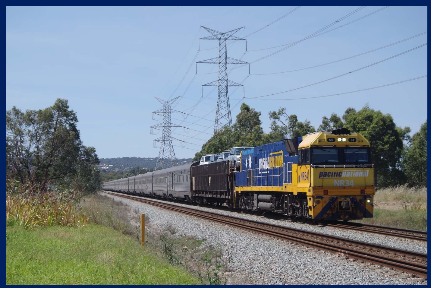
NR34 on 1PA8 Indian Pacific Middle Swan November 5th.