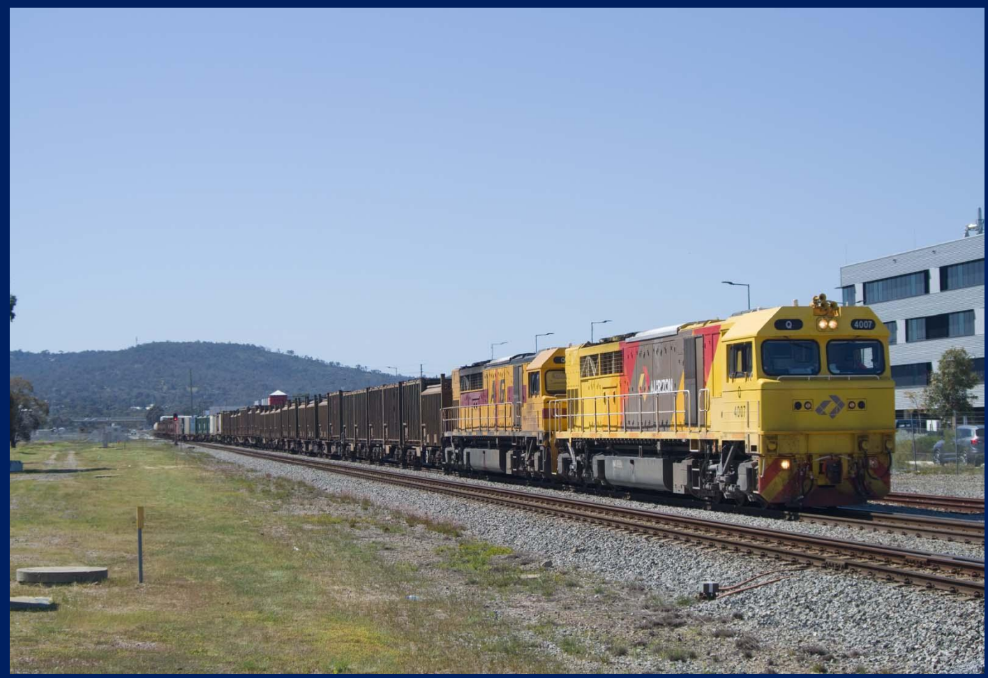
Q4007 & Q4012 on 4430 empty sulphur from Malcolm at Midland October 12th.