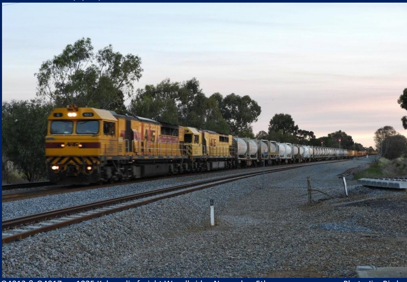
Q4012 & Q4017 on 1025 Kalgoorlie freight Woodbridge November 5th.