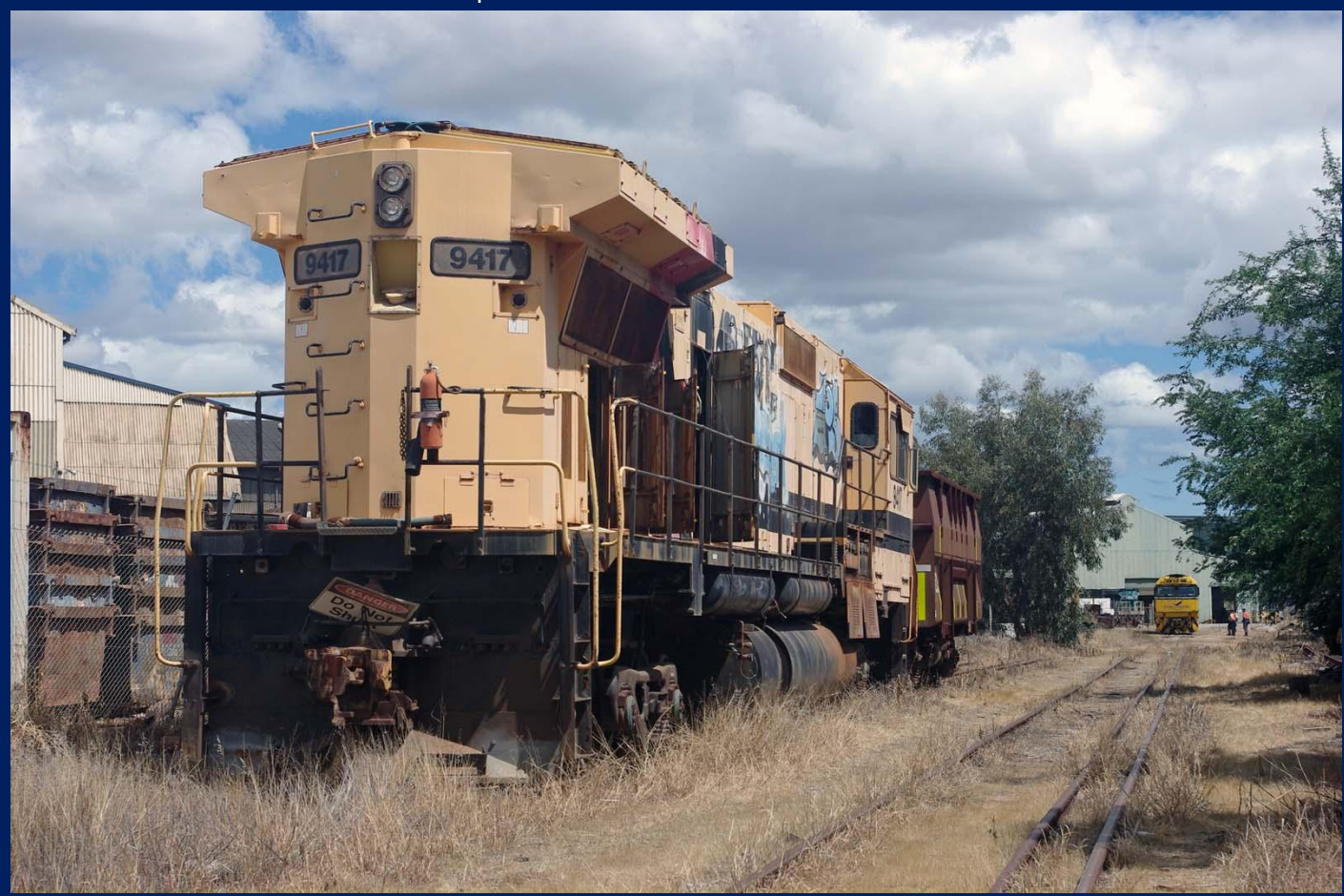
Former Robe River GE CM40-8M stored at UGL Bassendean October 3rd.