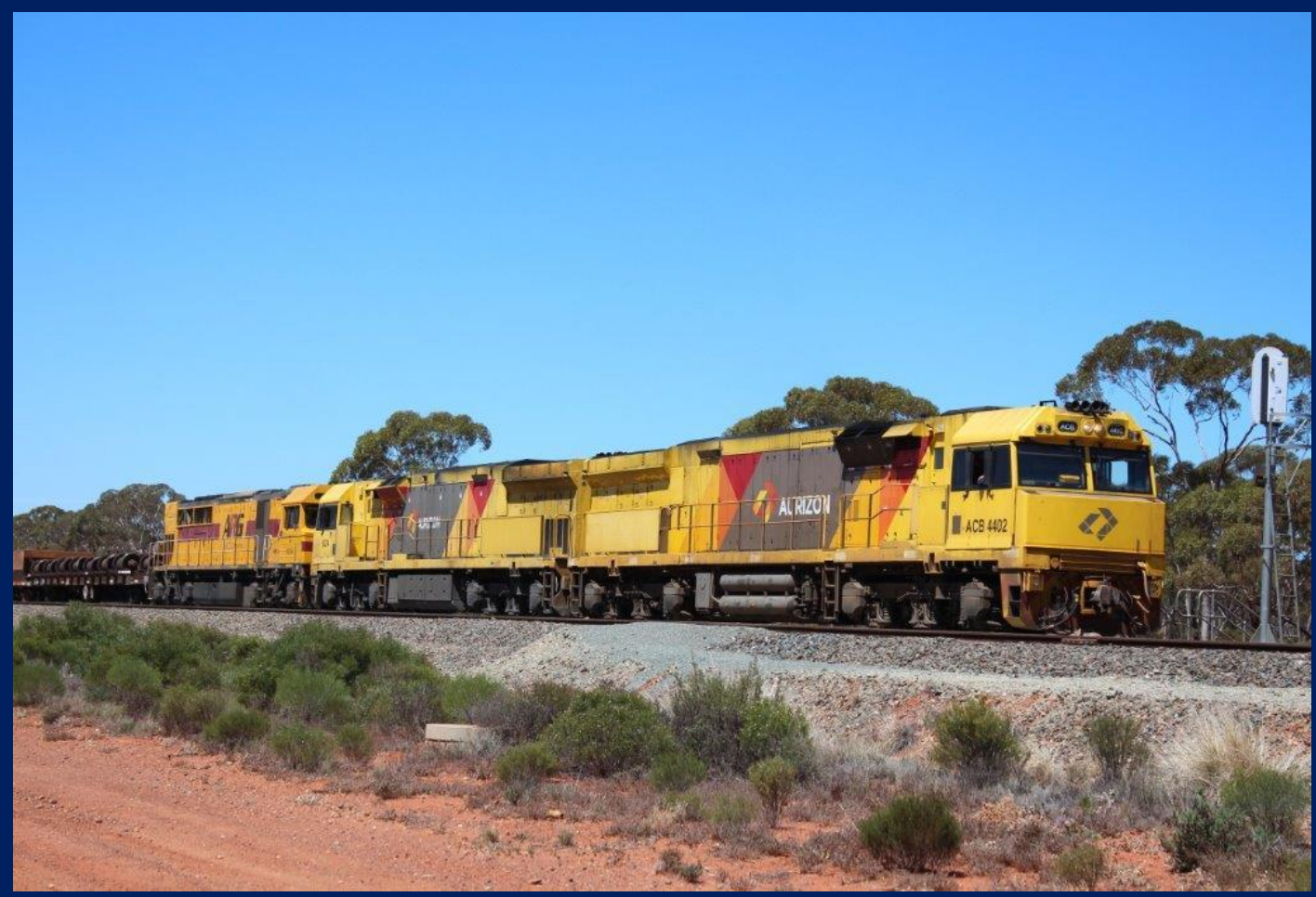
ACB4402, 6024 & Q4014 on 1414 empty ore about to shunt of Q and wheel wagon Binduli 5/11.