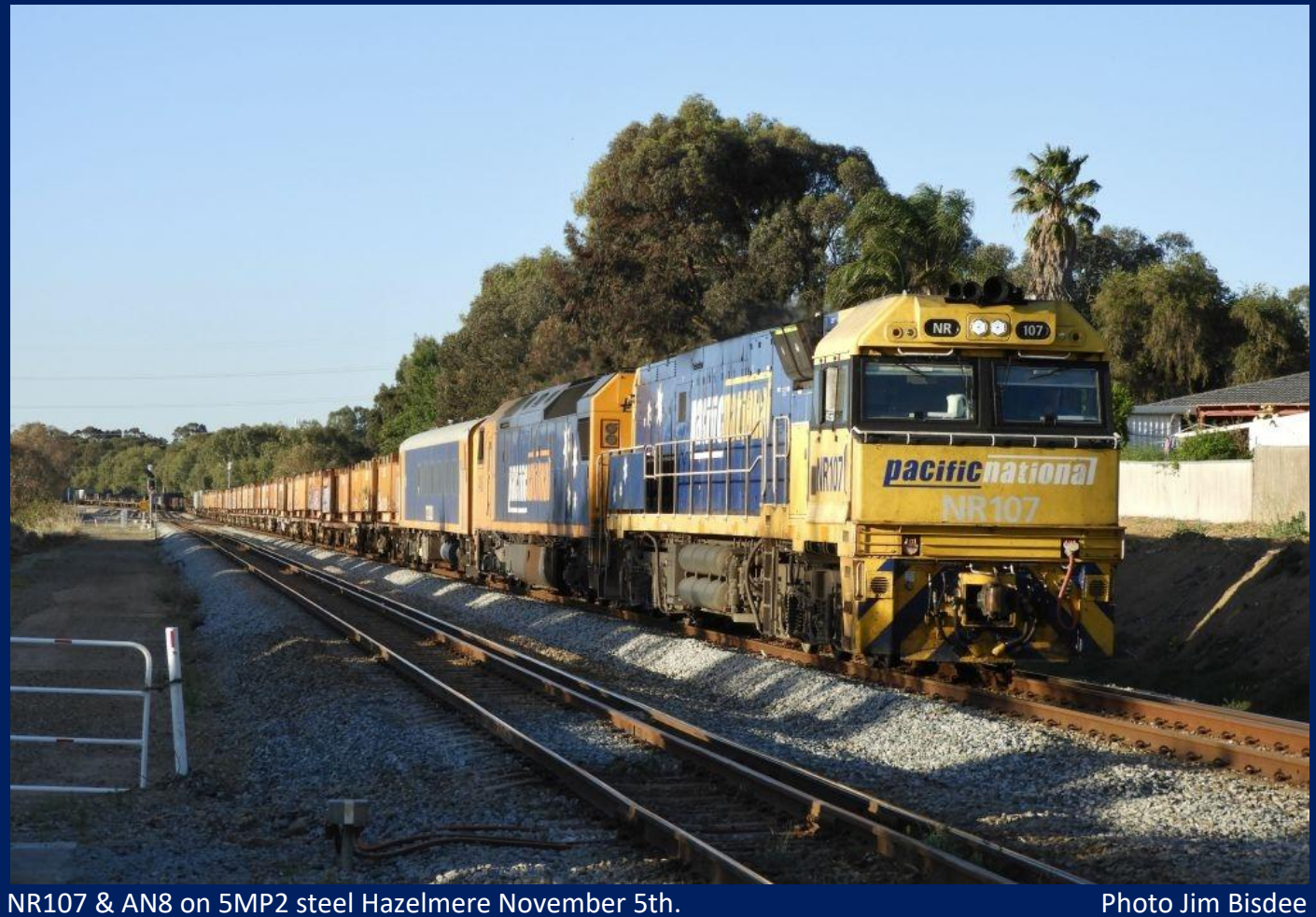
NR107 & AN8 on 5MP2 steel Hazelmere November 5th.