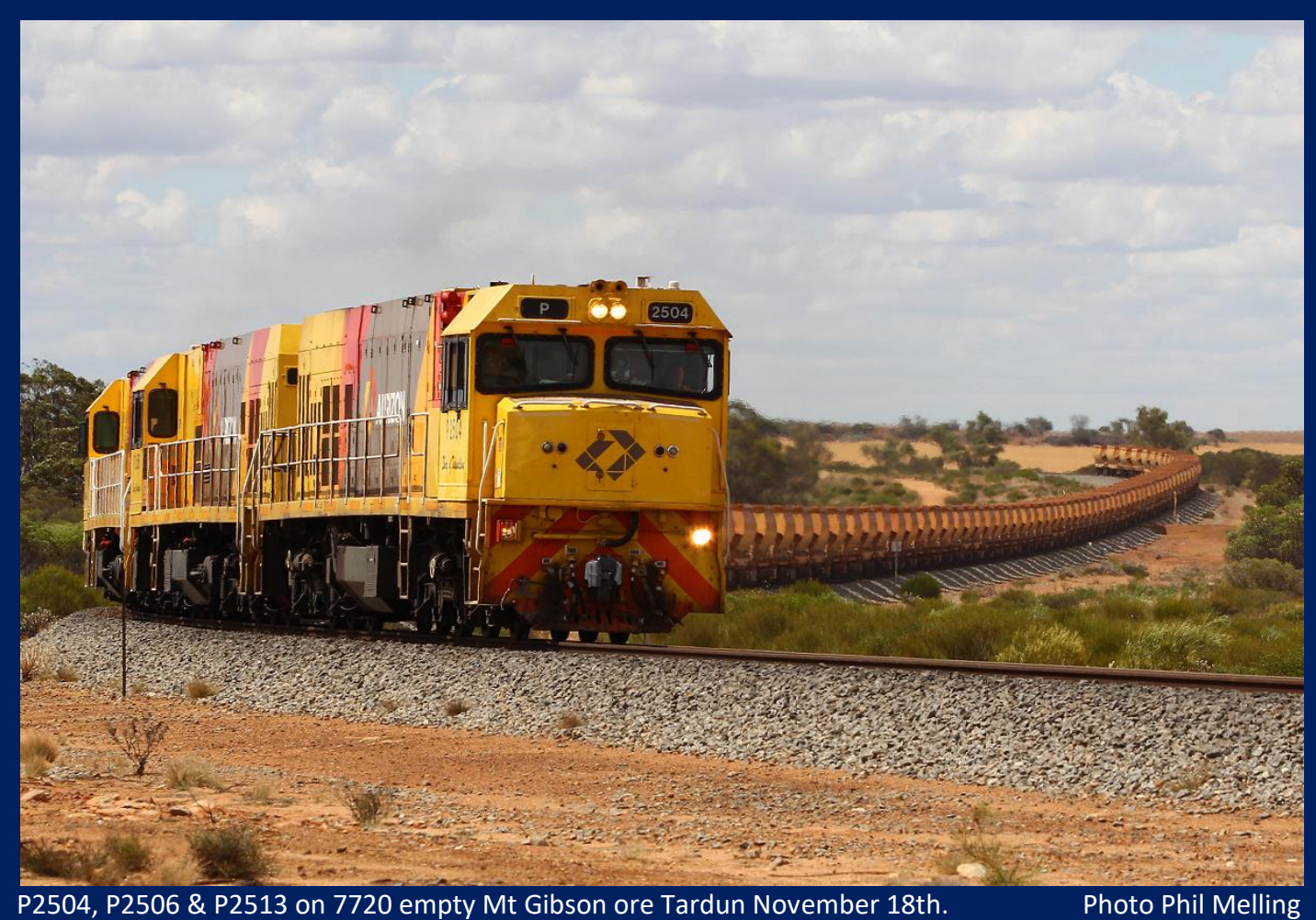
P2504, P2506 & P2513 on 7720 empty Mt Gibson ore Tardun November 18th.