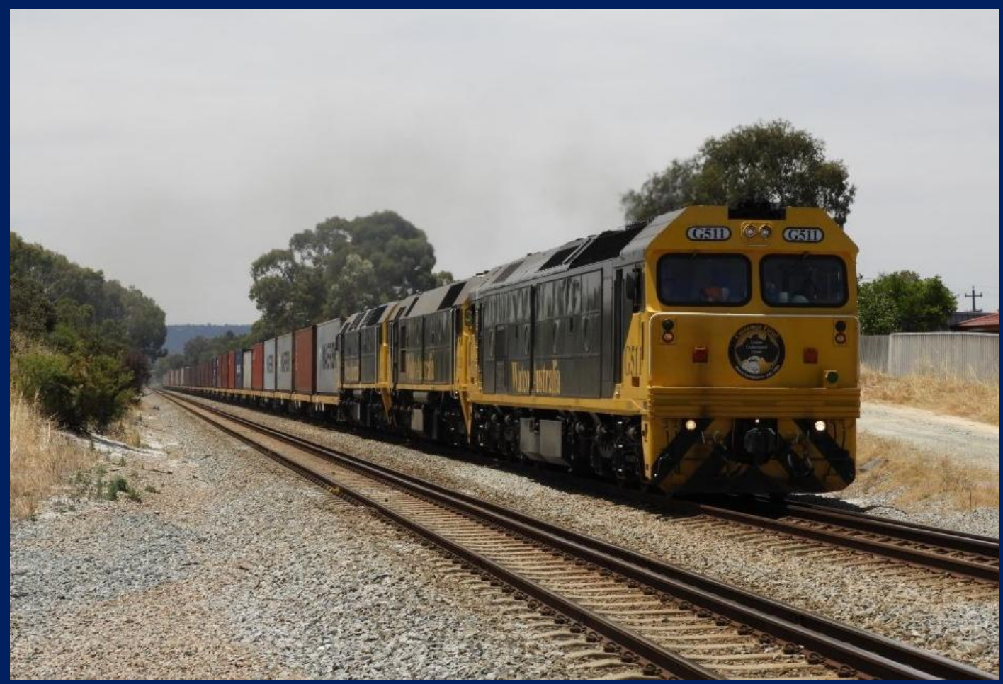
G511, FL220 & failed HL203 on 6142 port shuttle to North Port November 24th.