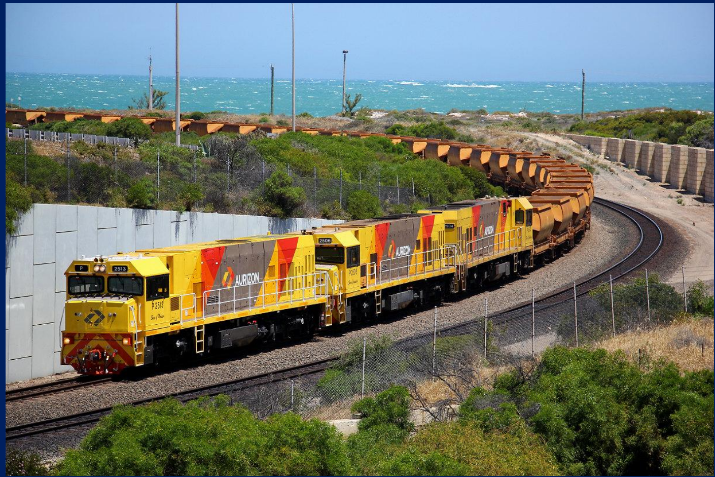
P2513, P2506 & P2504 on 3721 Mt Gibson ore entering Geraldton Port November 14th. Photo Phil Melling

Publisher: Jim Bisdee Email: <a href="mailto:pm1225@bigpond.com">pm1225@bigpond.com</a> Copyright Jim Bisdee © 2017