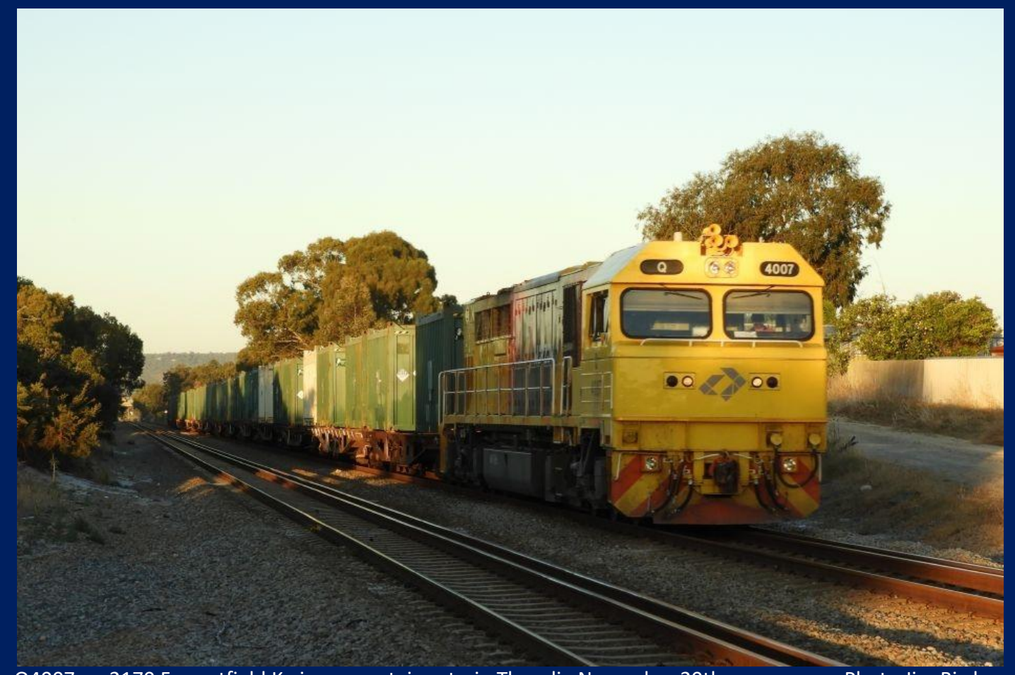
Q4007 on 2170 Forrestfield Kwinana container train Thornlie November 20th.