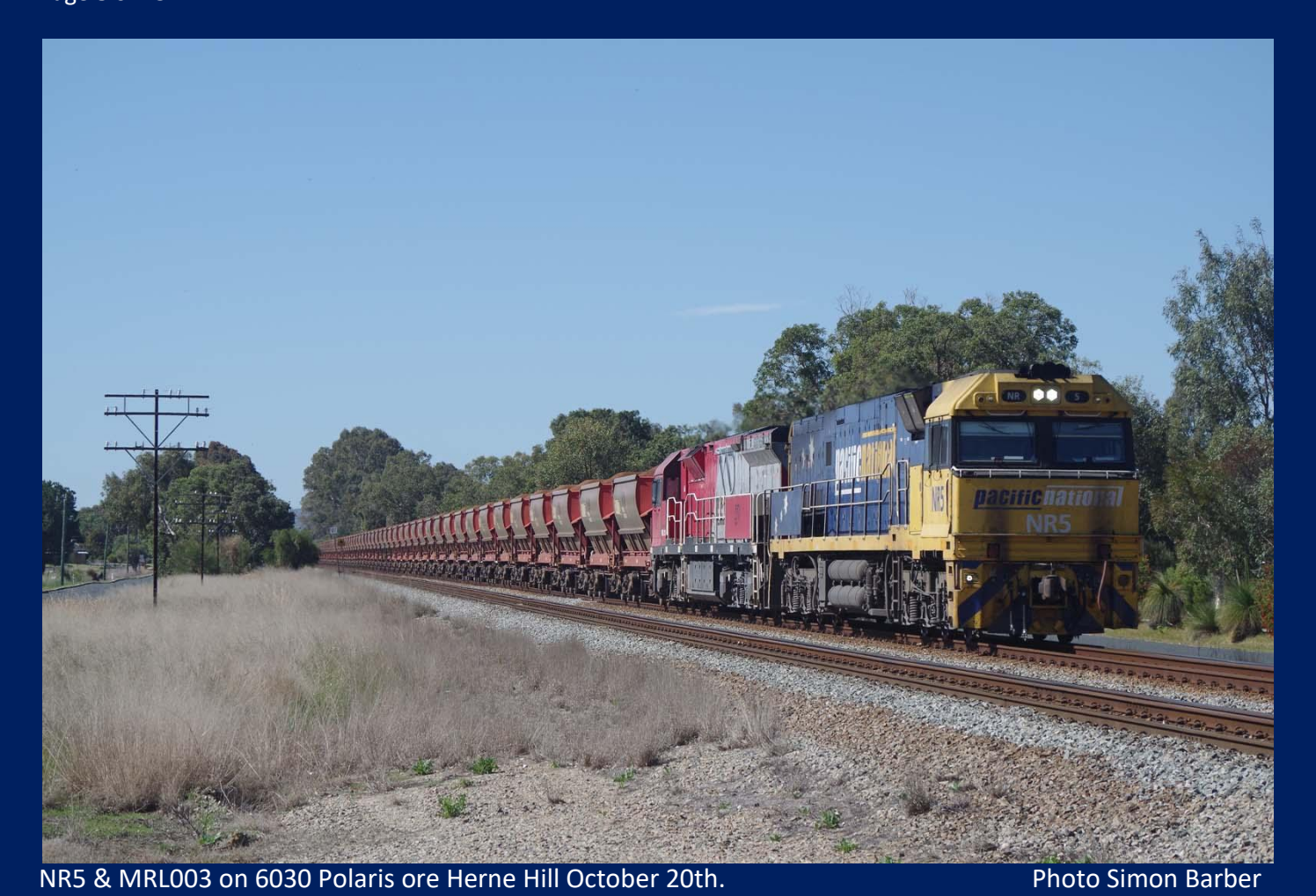
NR24 & MRL001 on 5030 Polaris ore Woodbridge October 19th.