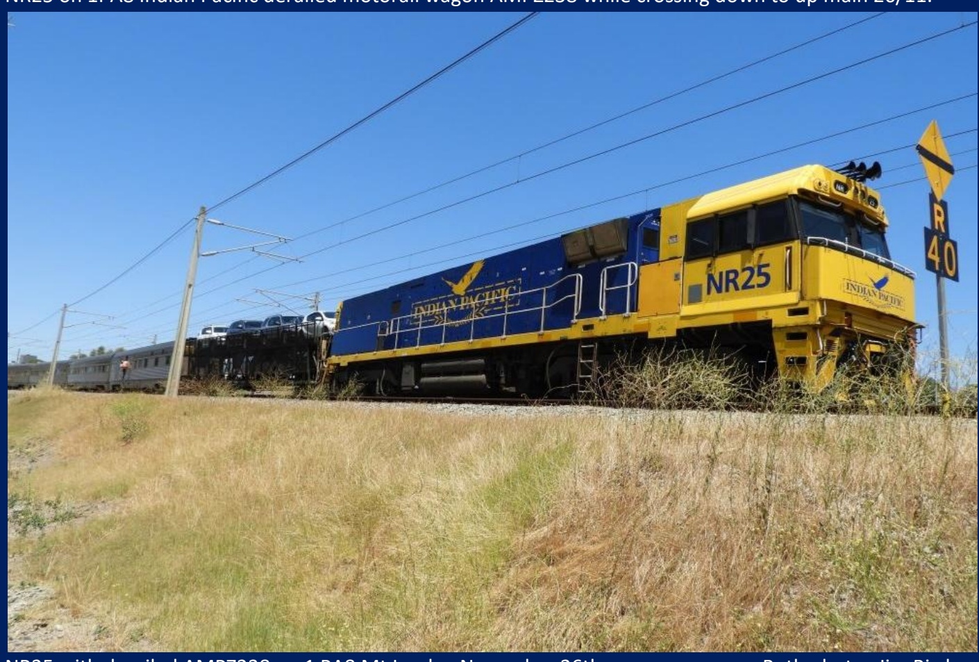
NR25 with derailed AMPZ238 on 1 PA8 Mt Lawley November 26th.