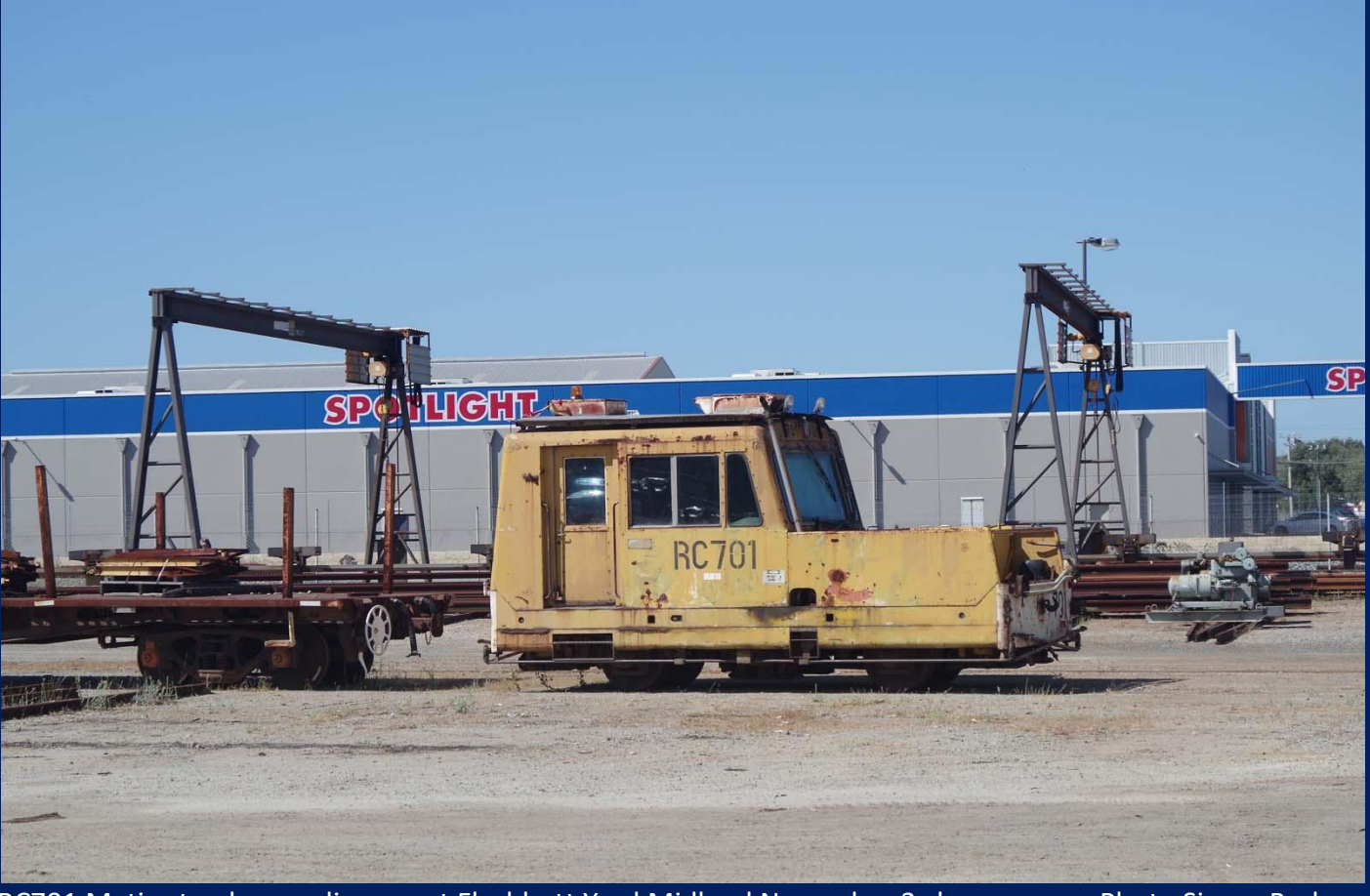
RC701 Matisa track recording car at Flashbutt Yard Midland November 3rd.