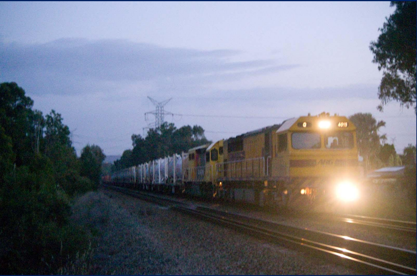
Q4013 & LZ3106 on 1025 Kalgoorlie freight Swan View October 22nd.