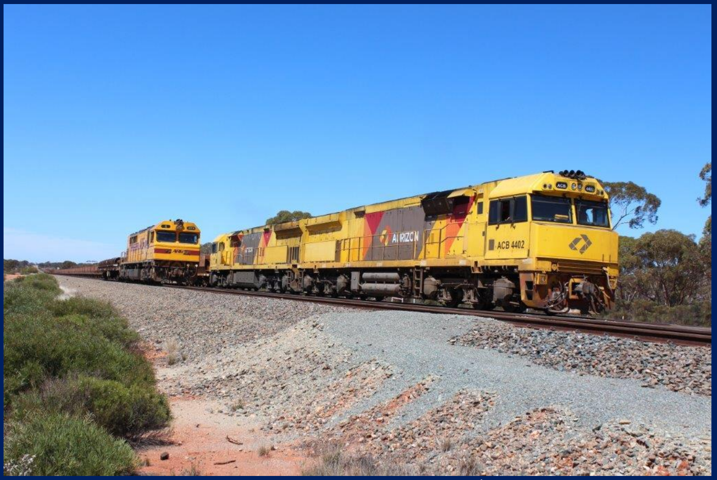
ACB4402 & 6024 on 1414 empty ore Q wheel wagon departing Binduli 5/11.