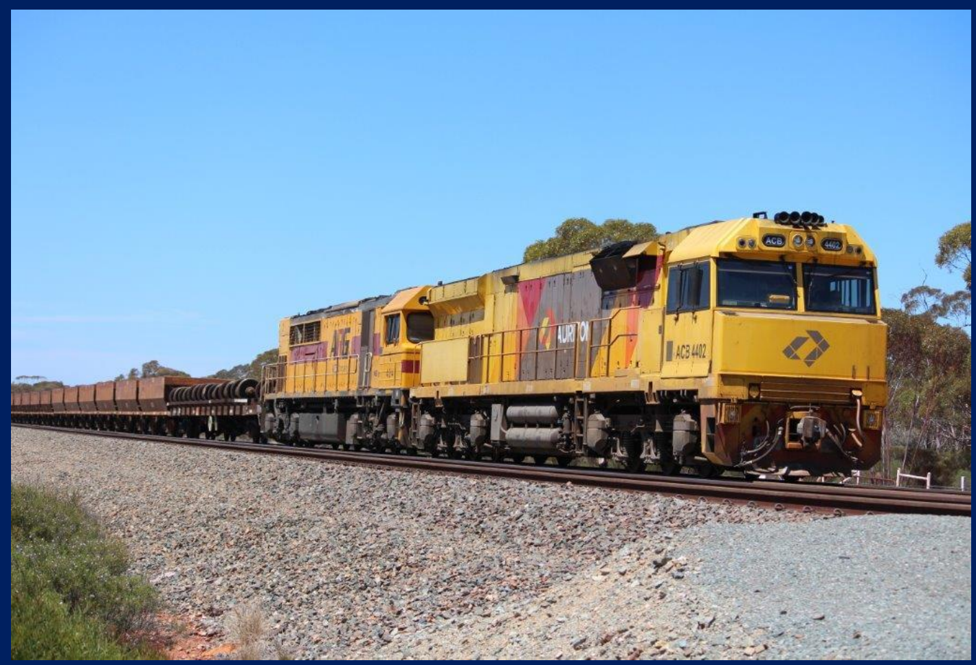
ACB4402 & Q4014 on 1414 empty ore with wheel wagon from wagon repair Esperance Binduli 5/11.