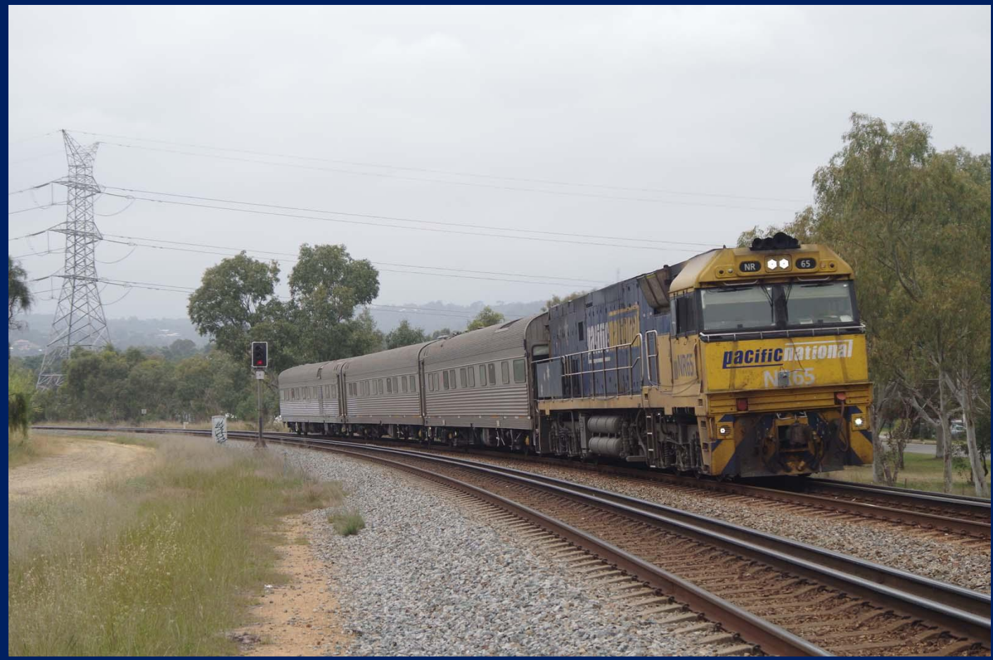
NR65 on 2AK2 AK car inspection train Bellevue October 23rd.