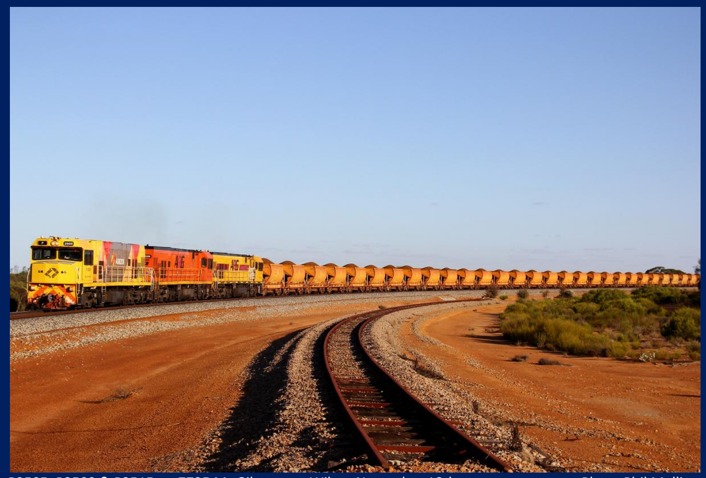
P2505, P2509 & P2515 on 7725 Mt Gibson ore Wilroy November 18th.