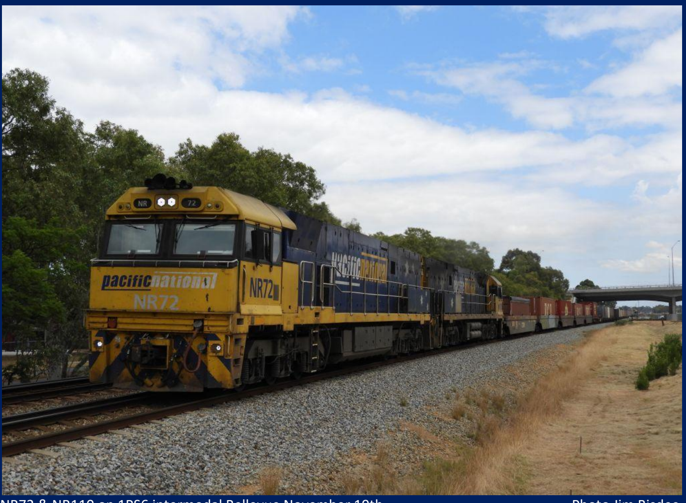
NR72 & NR110 on 1PS6 intermodal Bellevue November 19th.