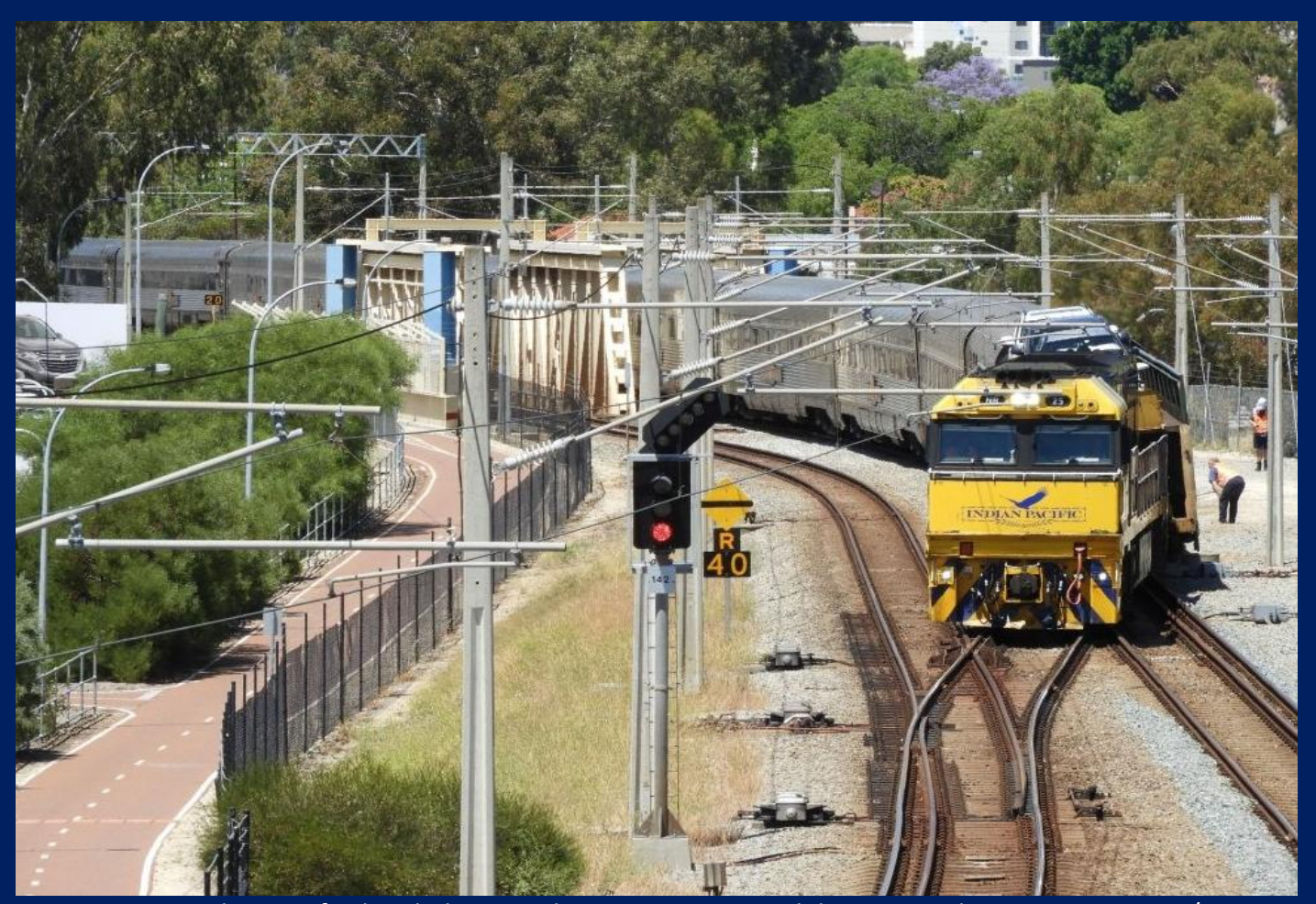
NR25 on 1PA8 Indian Pacific derailed motorail wagon AMPZ238 while crossing down to up main 26/11.