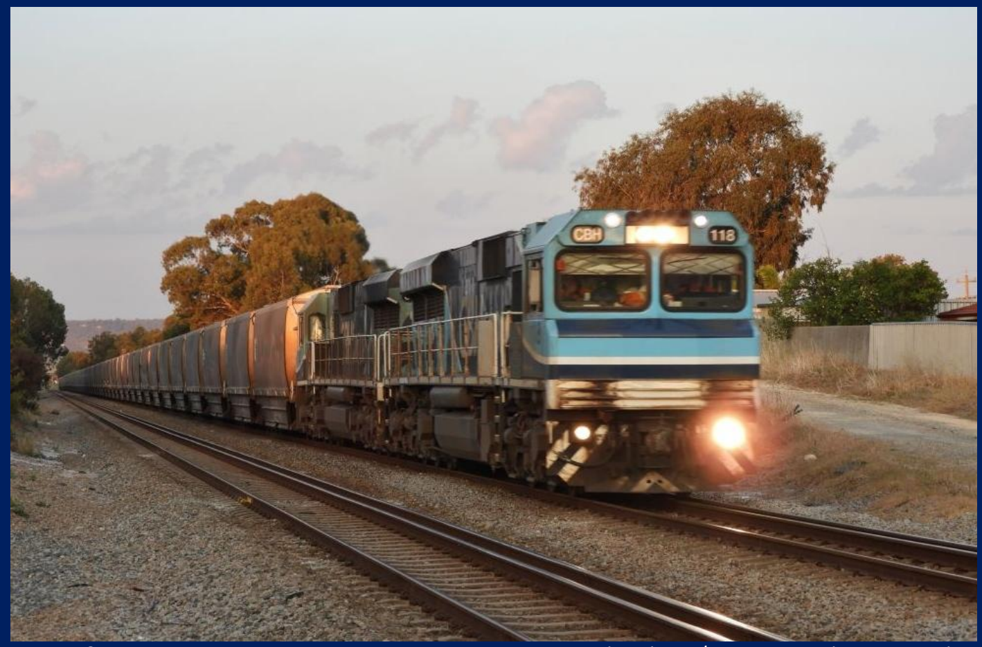
CBH118 & CBH120 on 2S56 Watco grain ex MGC to CBH Kwinana Thornlie 13/11.