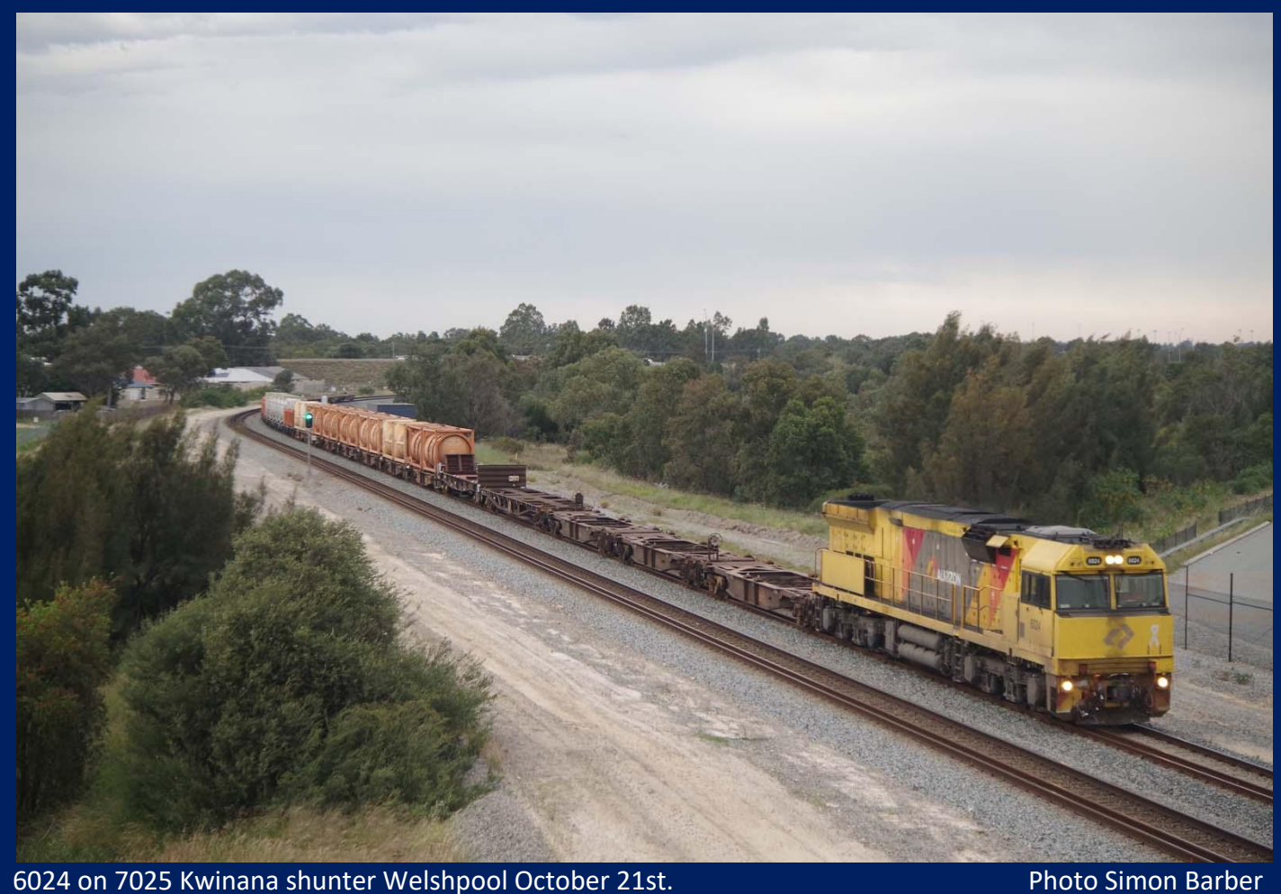
6024 on 7025 Kwinana shunter Welshpool October 21st.