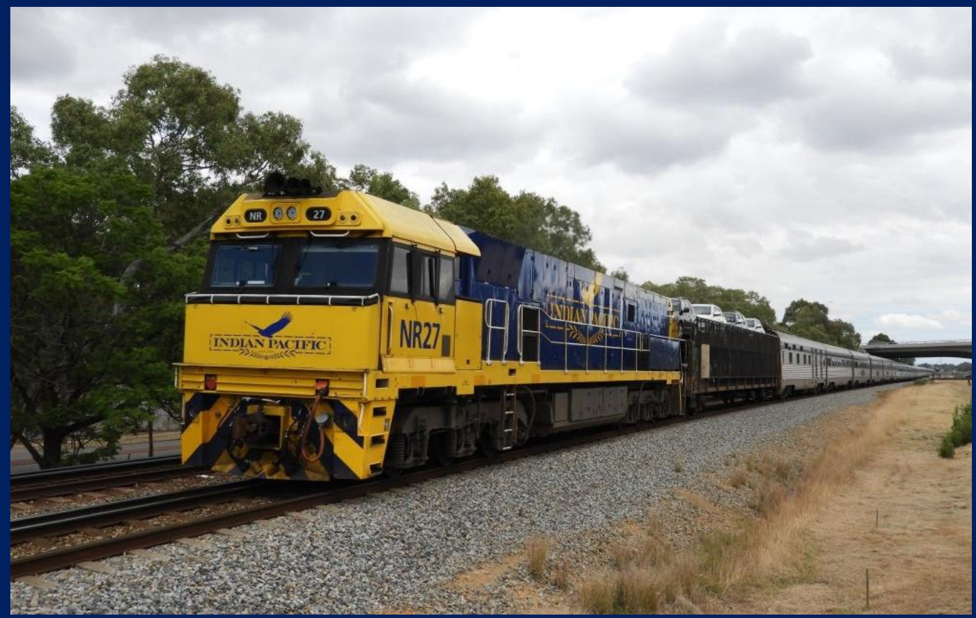
NR27 on 1PA8 Indian Pacific Bellevue November 19th.