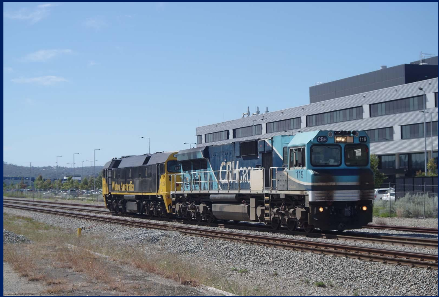
CBH119 hauling FL220 past Midland Hospital on way to UGL November 3rd.