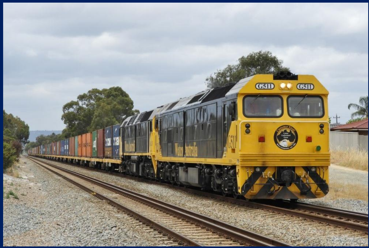
G511 & HL203 on 6142 port shuttle Forrestfield to North Port Thornlie 17/11.