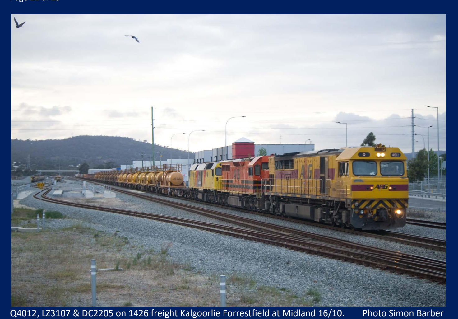
P2513 & P2513 on 2755 light engine Forrestfield Narngulu at Swan View 21/10.