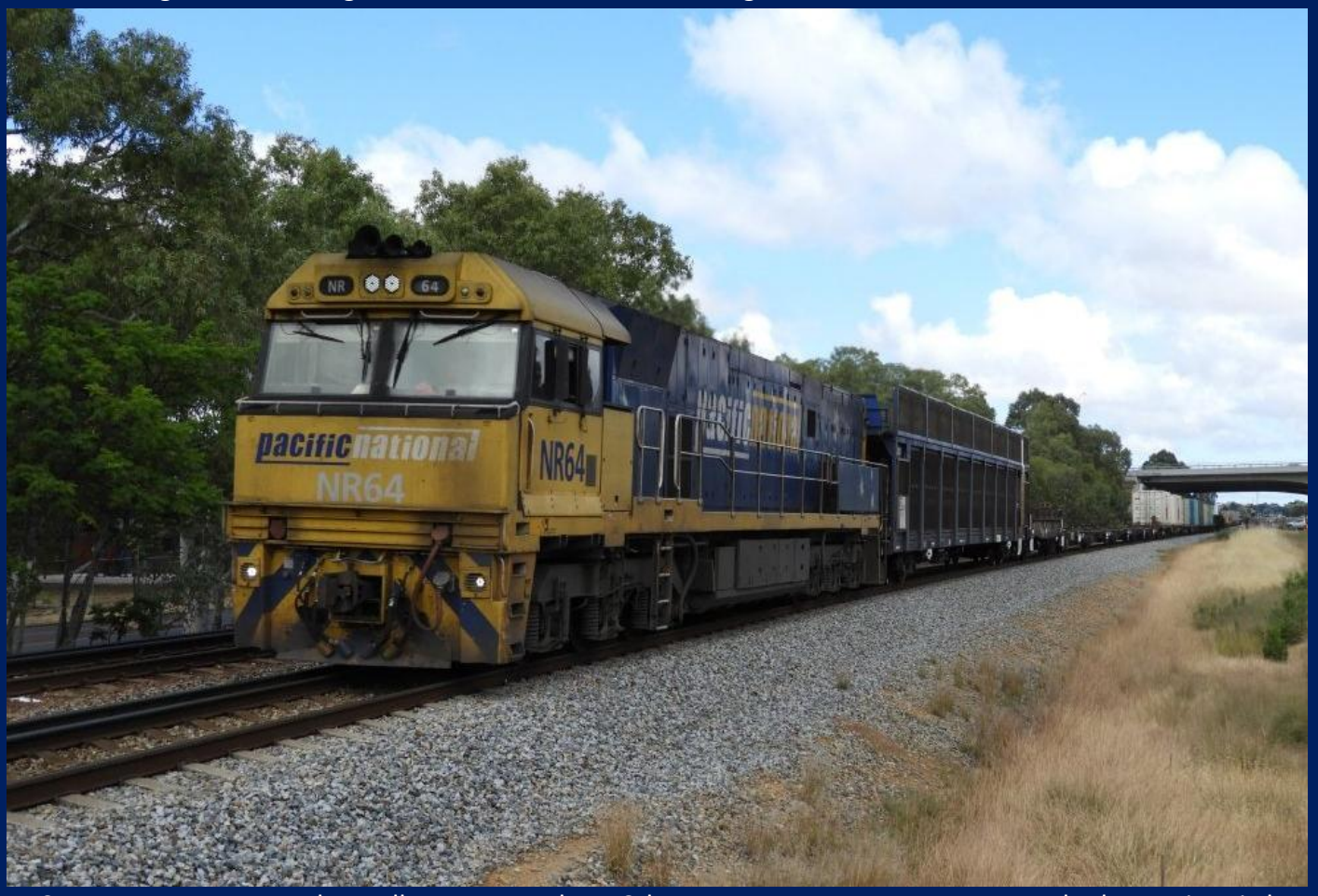
NR64 on 7PX4 empty steel at Bellevue November 18th.