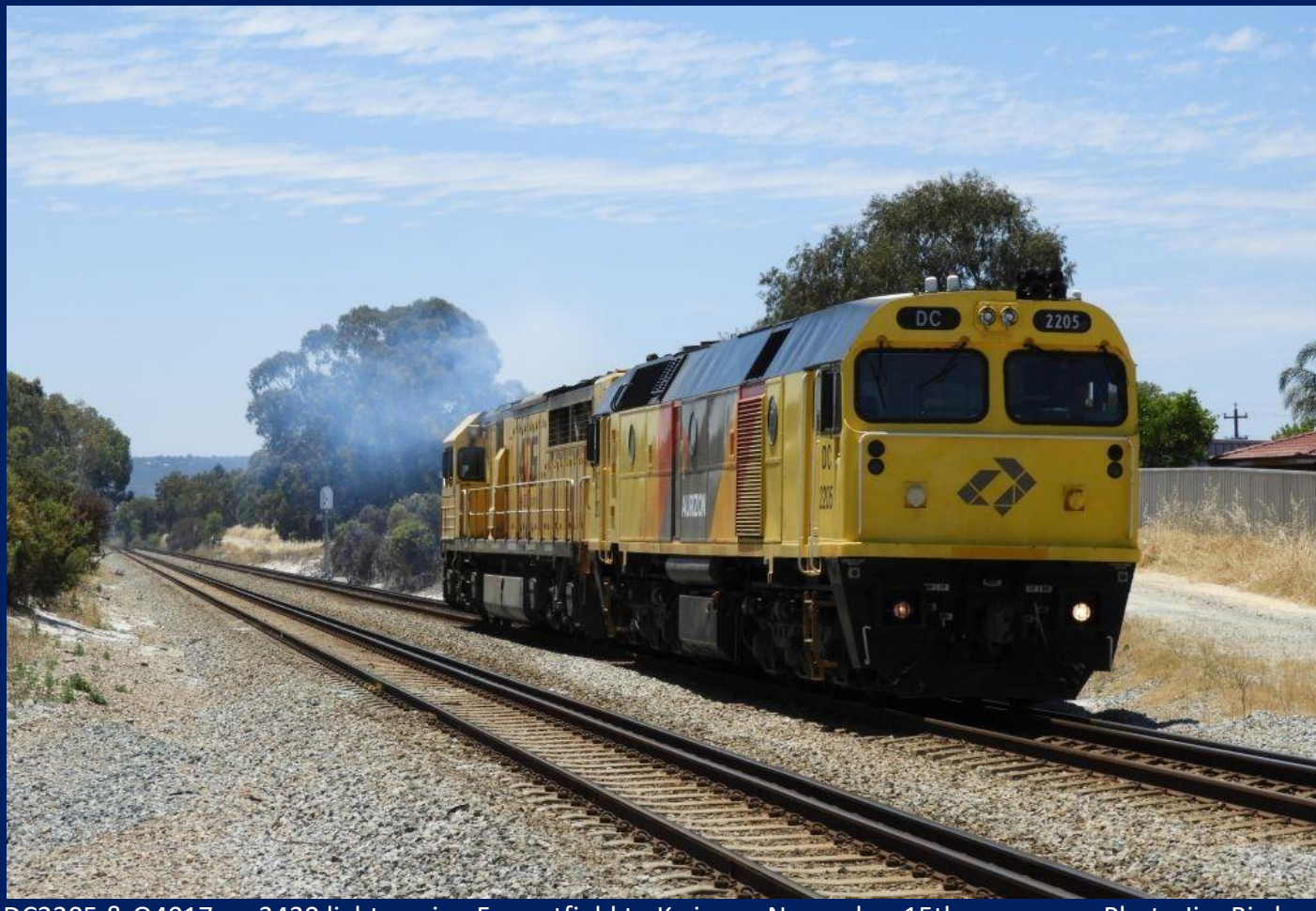
DC2205 & Q4017 on 3430 light engine Forrestfield to Kwinana November 15th.