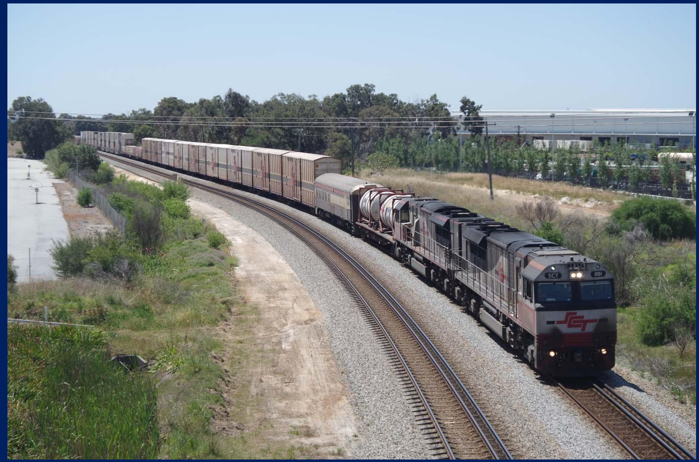
SCT001 & SCT002 on 6MP9 SCT freight South Guildford October 30th.