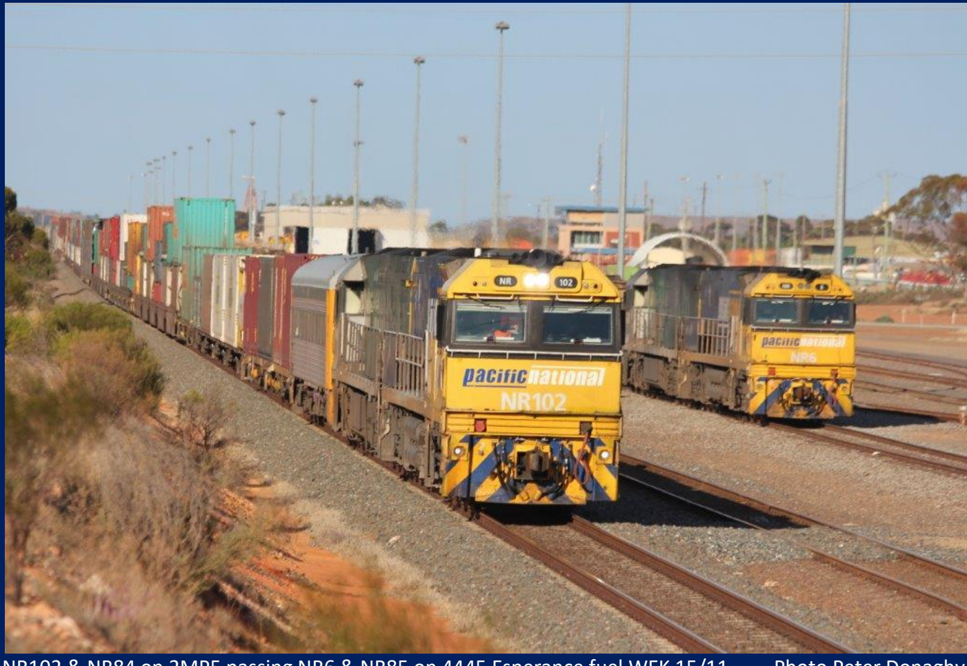
NR102 & NR84 on 2MP5 passing NR6 & NR85 on 4445 Esperance fuel WEK 15/11.