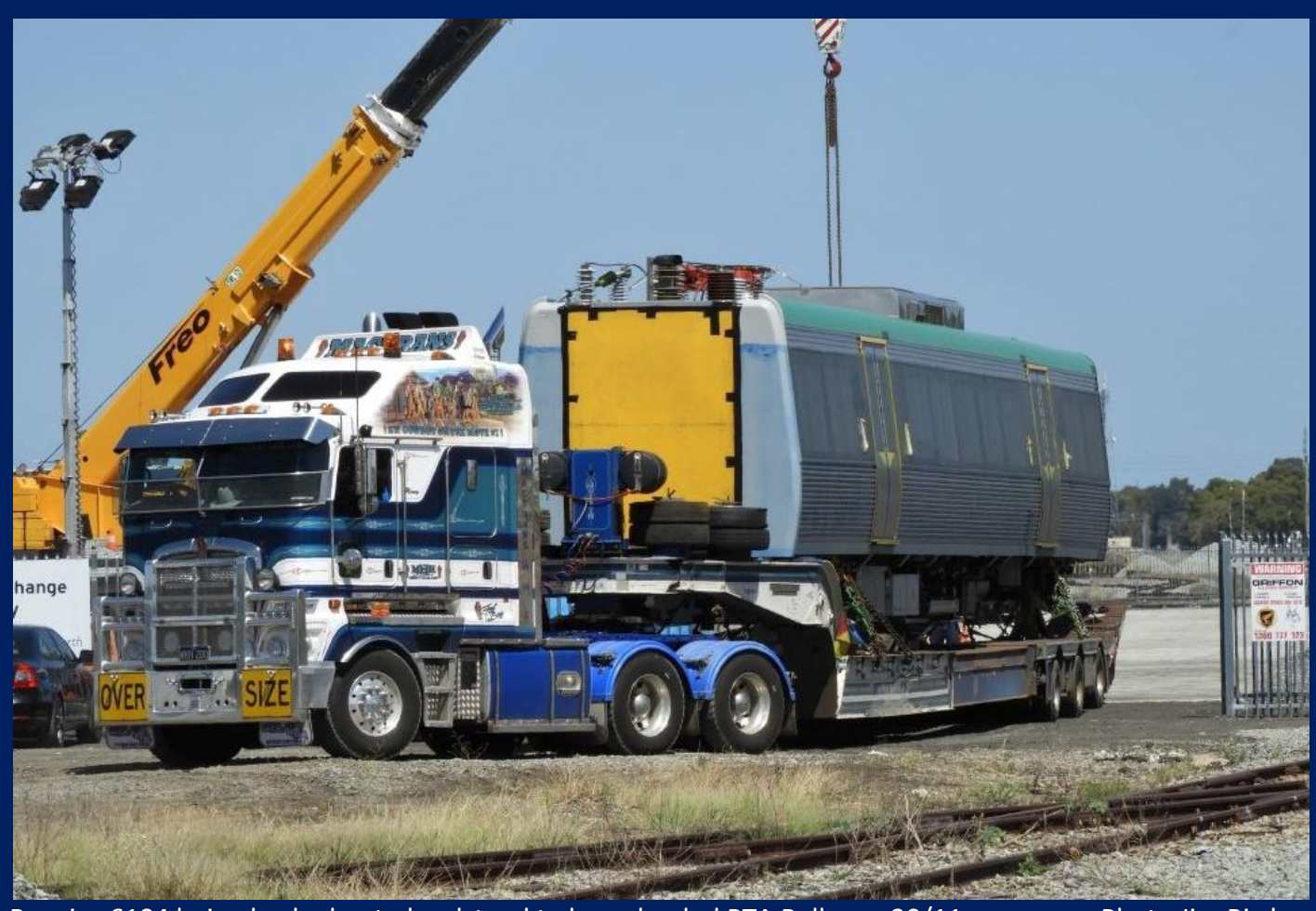
B series 6104 being backed onto hardstand to be unloaded PTA Bellevue 30/11.