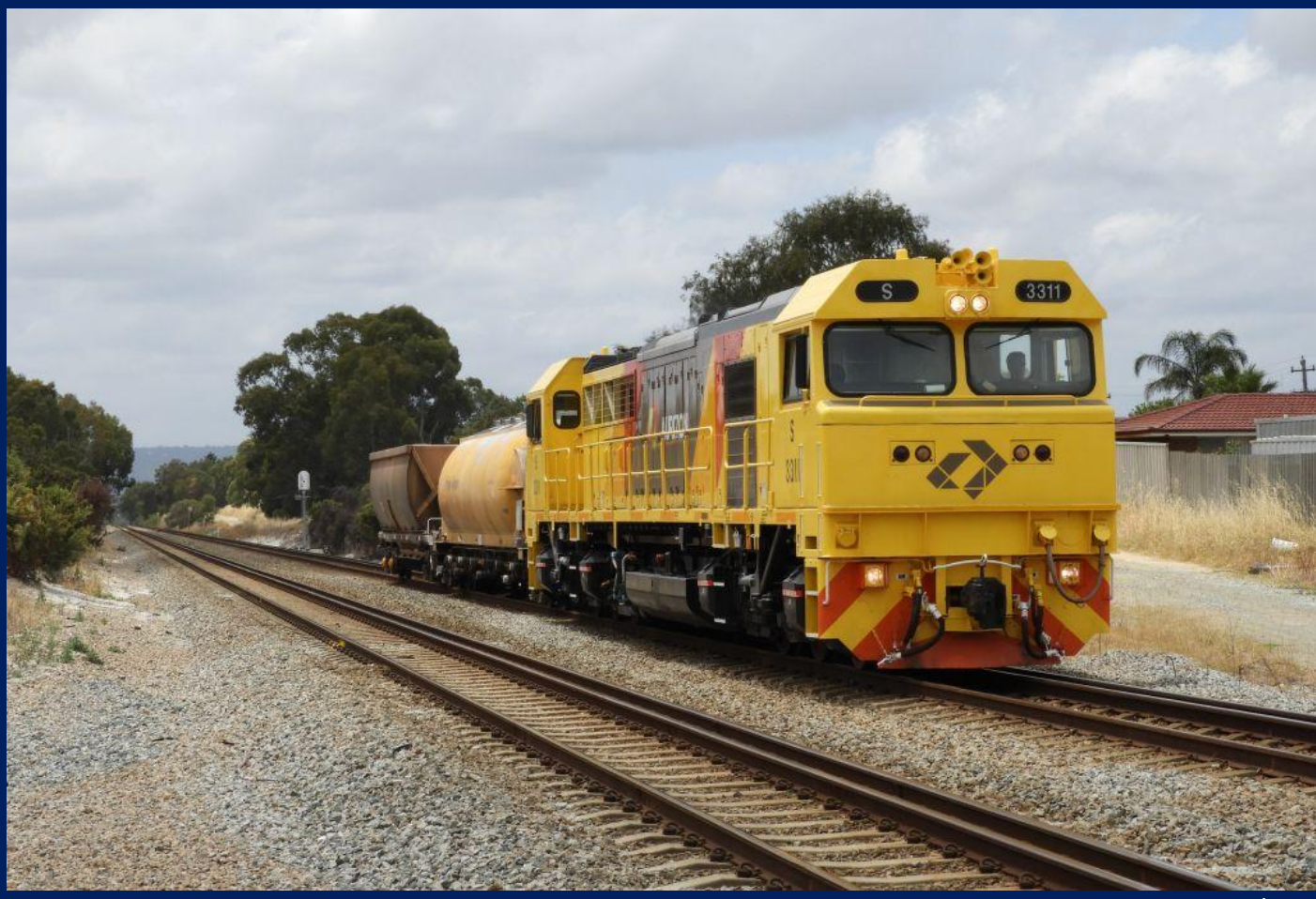
S3111 hauling XP and XC wagons on 6120 locomotive and wagon movement to Kwinana at Thornlie 17/11.