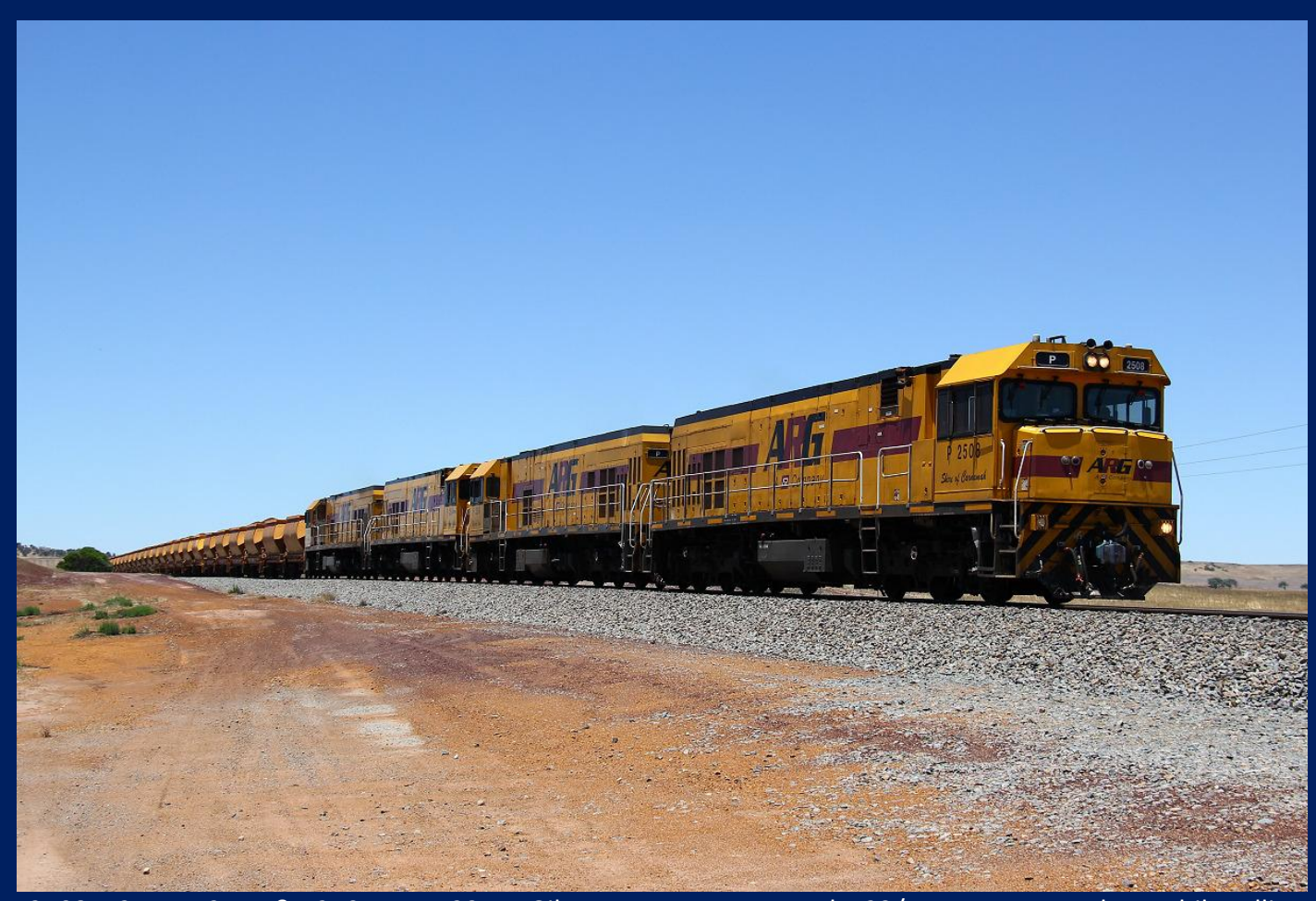
P2508, P2515, P2514 & P2501 on 4723 Mt Gibson ore Moonyoonooka 23/11.