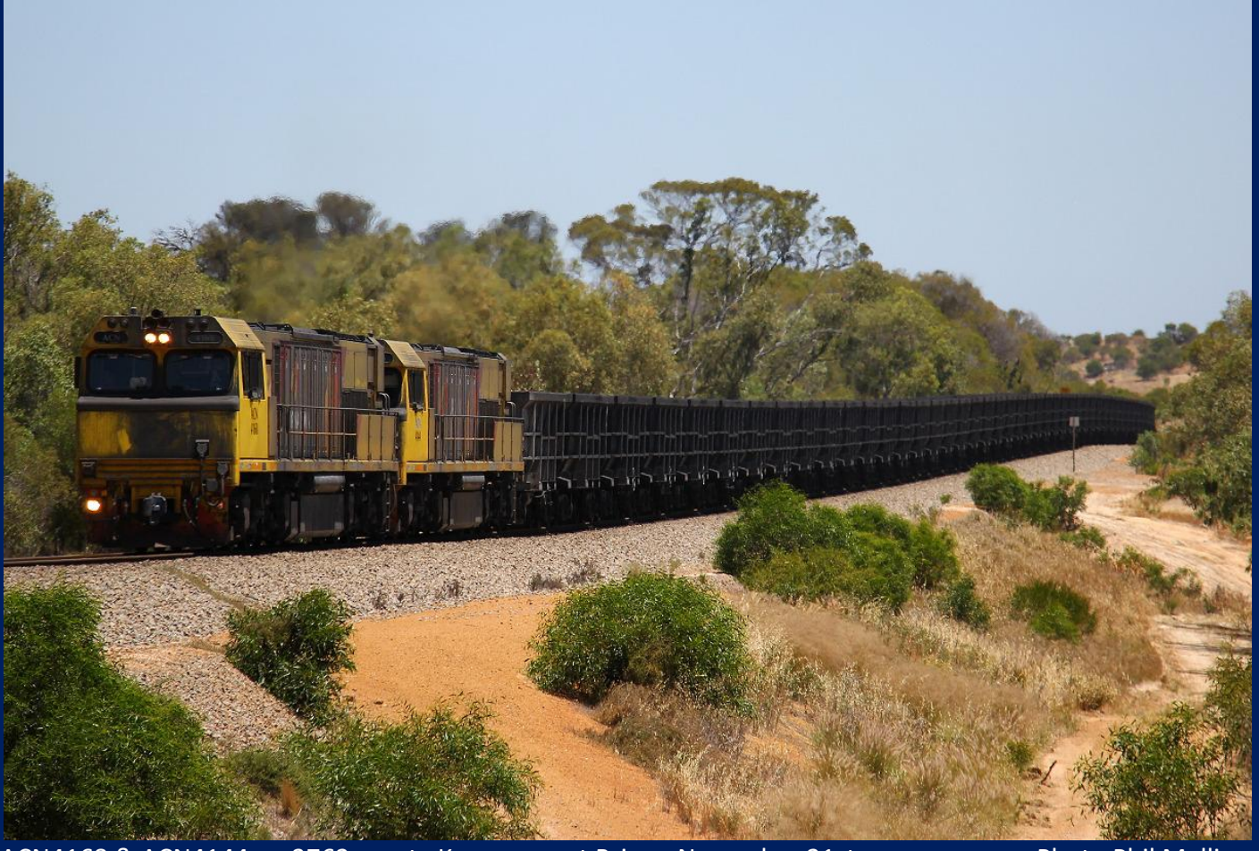
ACN4168 & ACN4144 on 3762 empty Karara ore at Bringo November 21st.