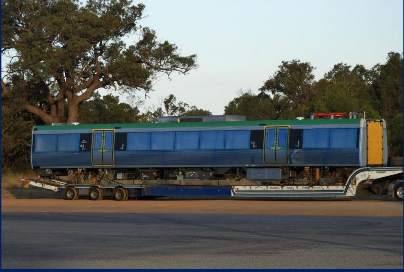
BET6104 B series trailer on transport float Chittering November 29th.