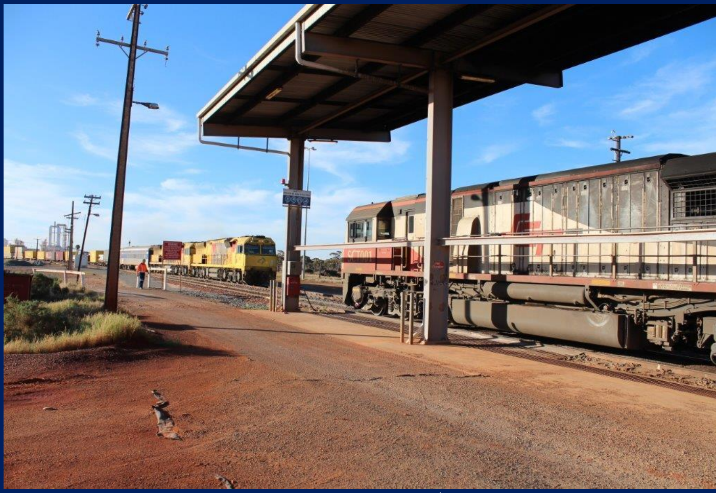
SCT001 on late 5MP9 crossing 6021 & 6023 on 7PM1 Parkeston 4/11.