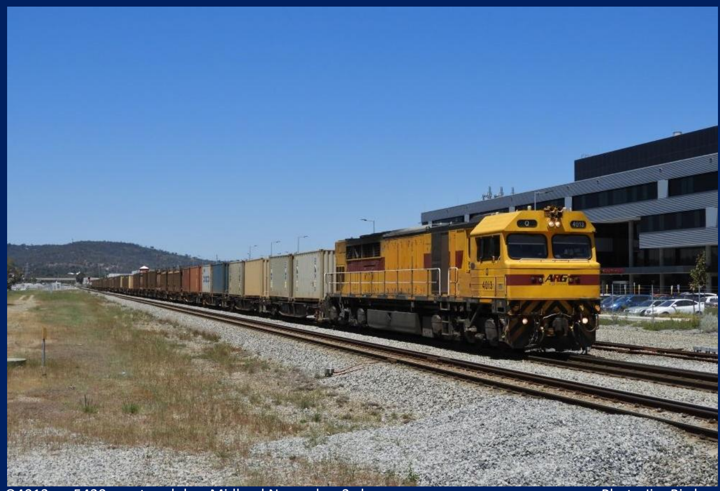
Q4013 on 5430 empty sulphur Midland November 3rd.