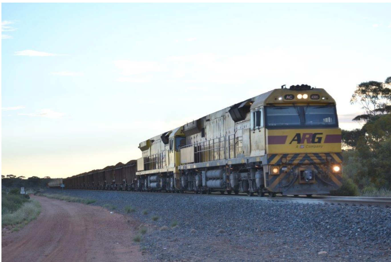
AC4305 & ACB4402 (DPU ACBs 4403 & 4404) on 1413 ore at dusk, Kurrawong, 11/3.