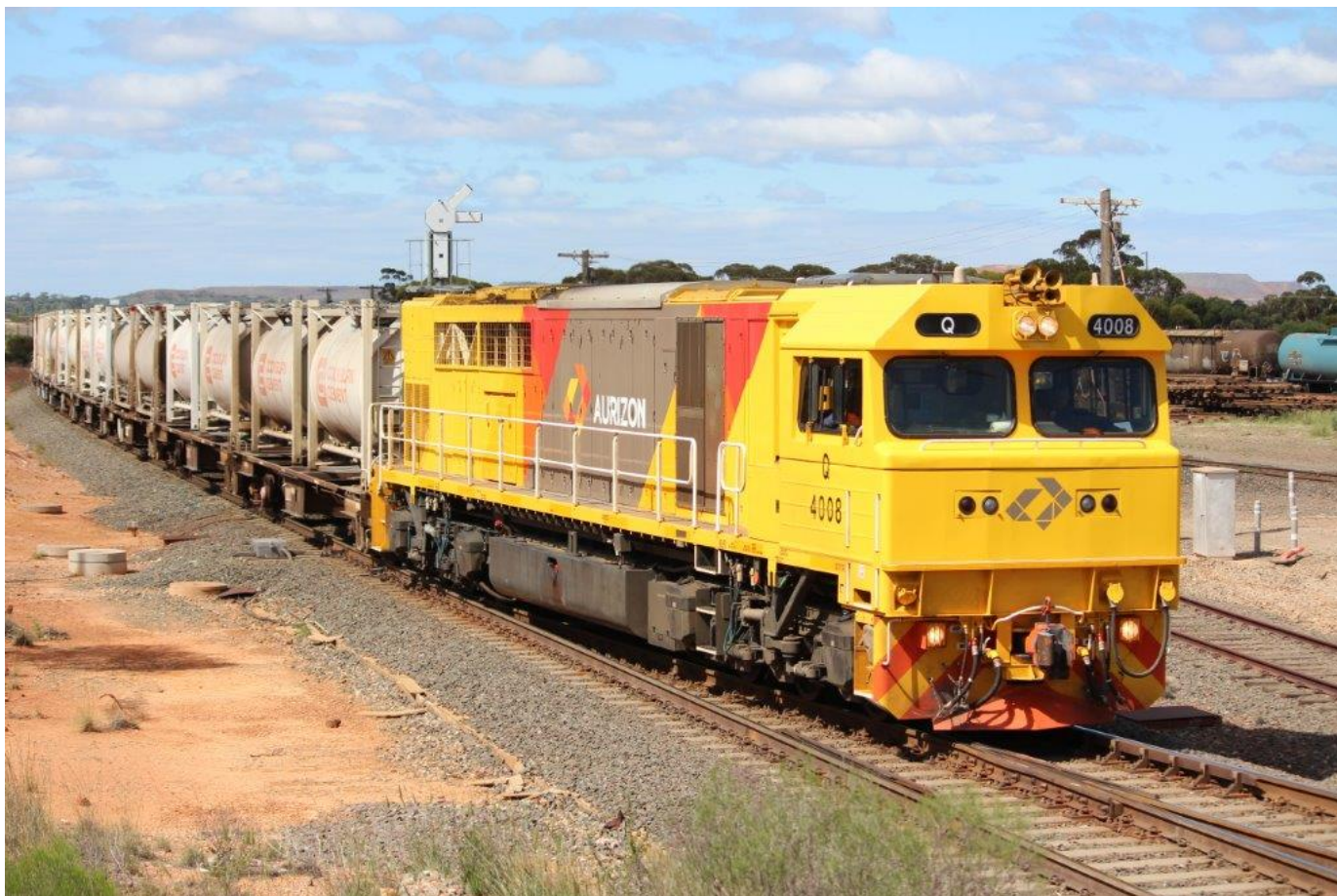
Just on a year since repaint, Q4008 brings 7C74 empty cement/lime shunt in from Parkeston, 3/4.