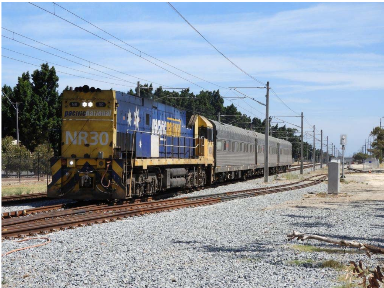
4AK4 from East Perth passes through Bassendean, March 7 th .