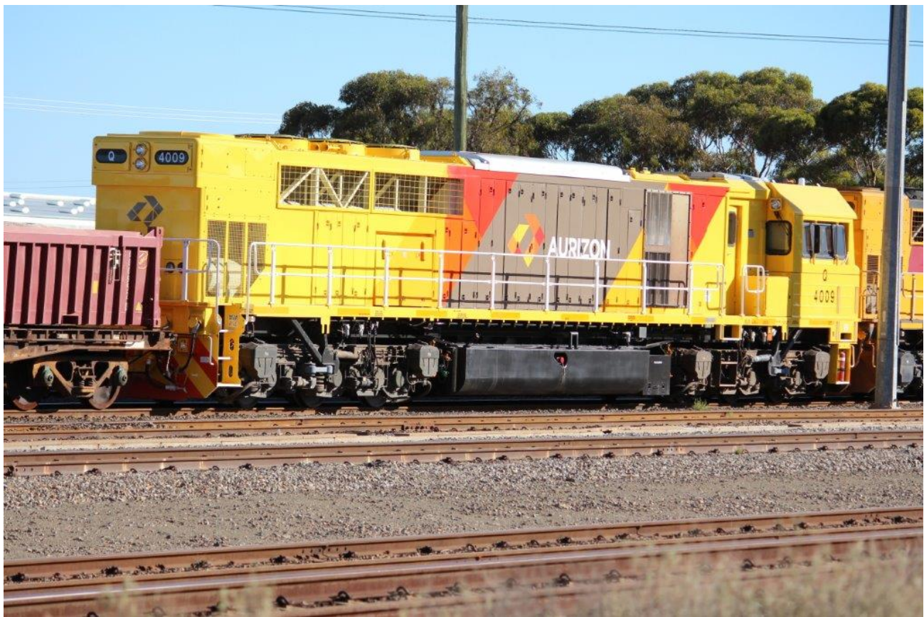
Following an overhaul which took just over a year, Q4009 finally emerged on March 7 th for a run to Kalgoorlie, seen here the following day ready to return to Perth. Note the bogies weren't repainted.