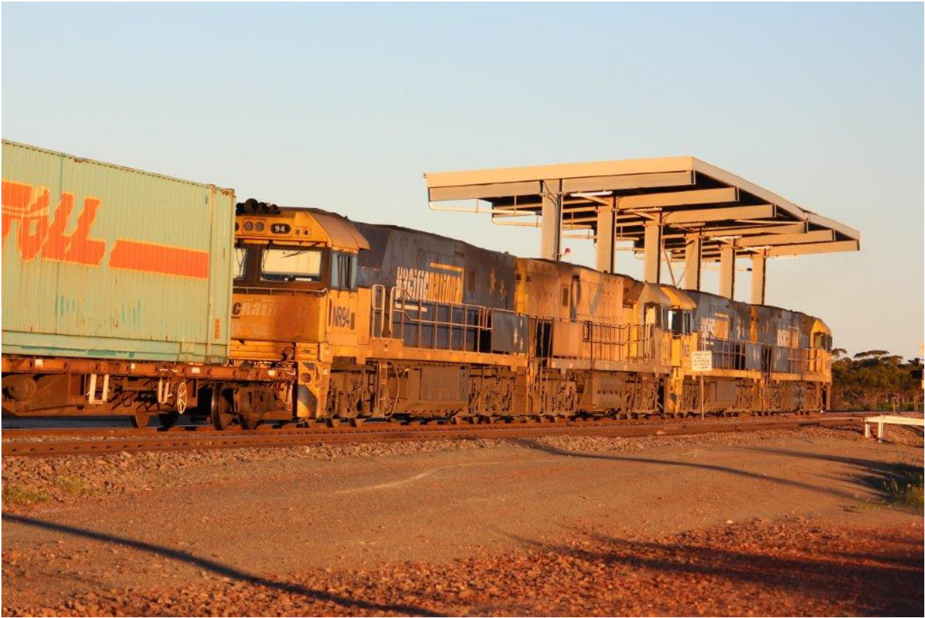
The last rays of sunlight catch NRs 89, 23 and hauled pair 18 and 94 on a very late 2PM5, Parkeston, 6/3.