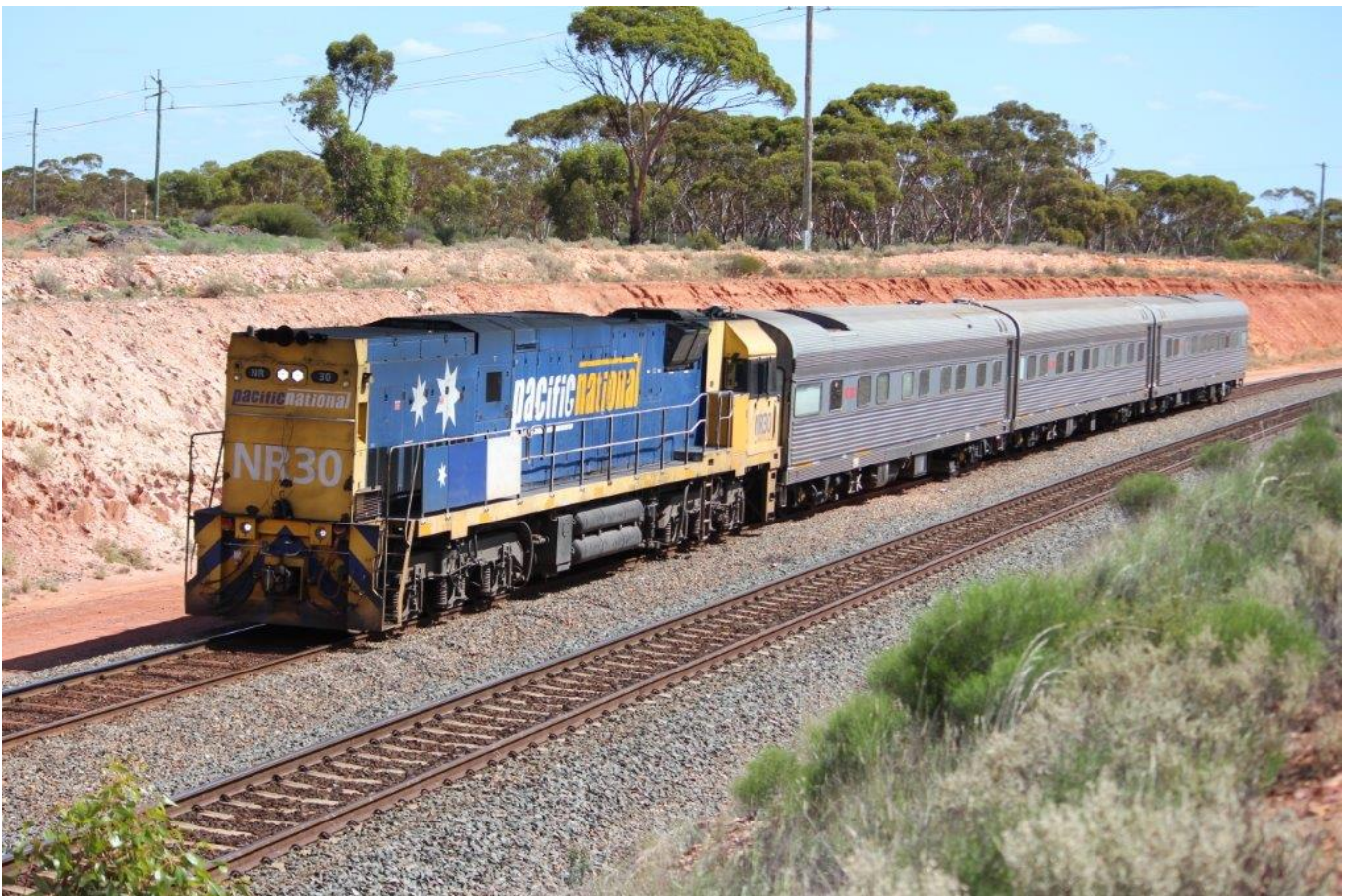
NR30 approaches West Kalgoorlie with 7AK2 from Esperance, March 3 rd .