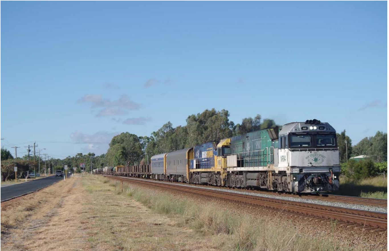
NRs 84 & 30 lead 7PX4 through Herne Hill, 10 th March. NR30 would be removed 1500kms away at Cook the next morning to resume AK car duties.