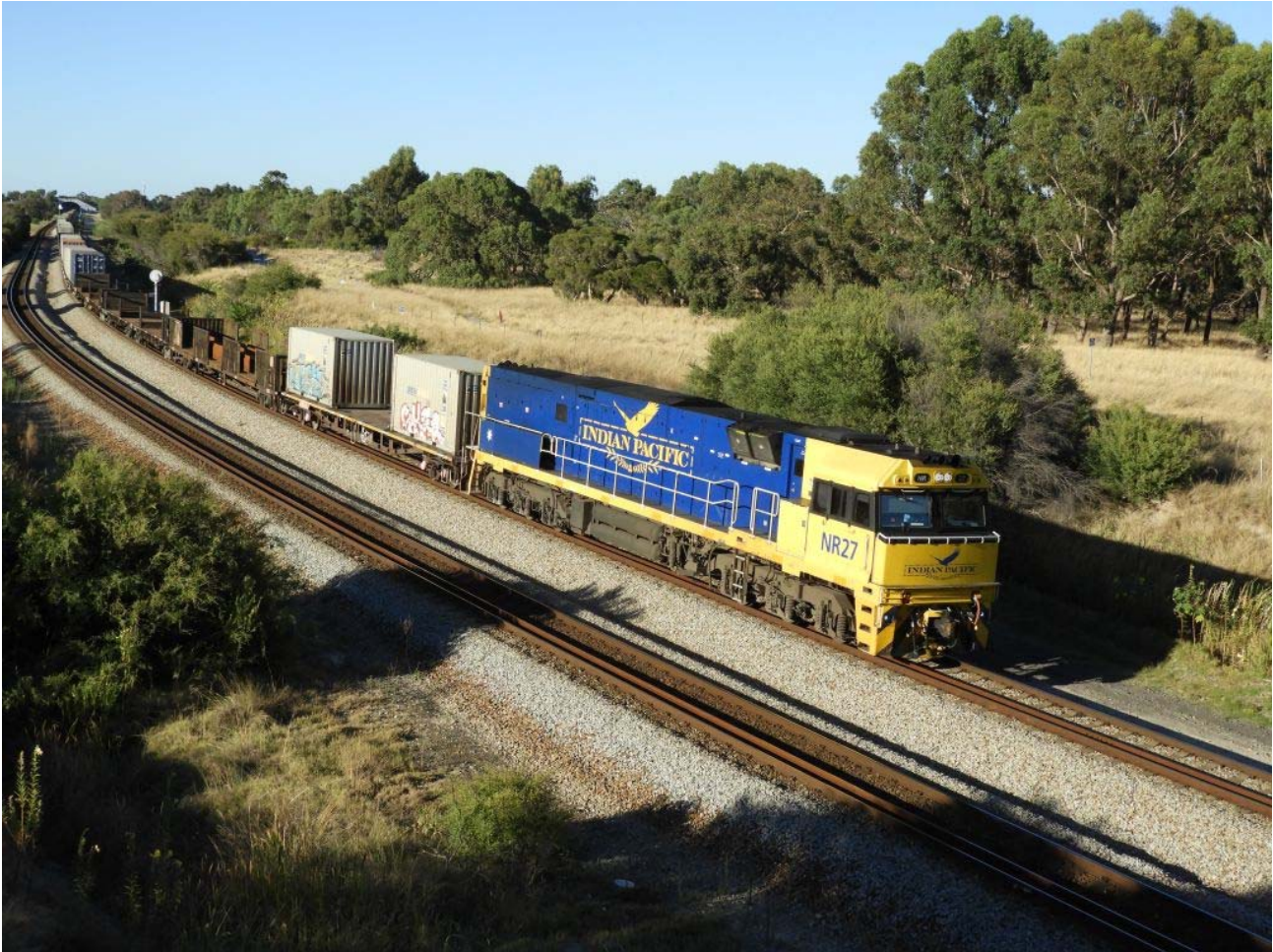
NR27 leads 7PX4 steel train through South Guildford, March 3 rd .