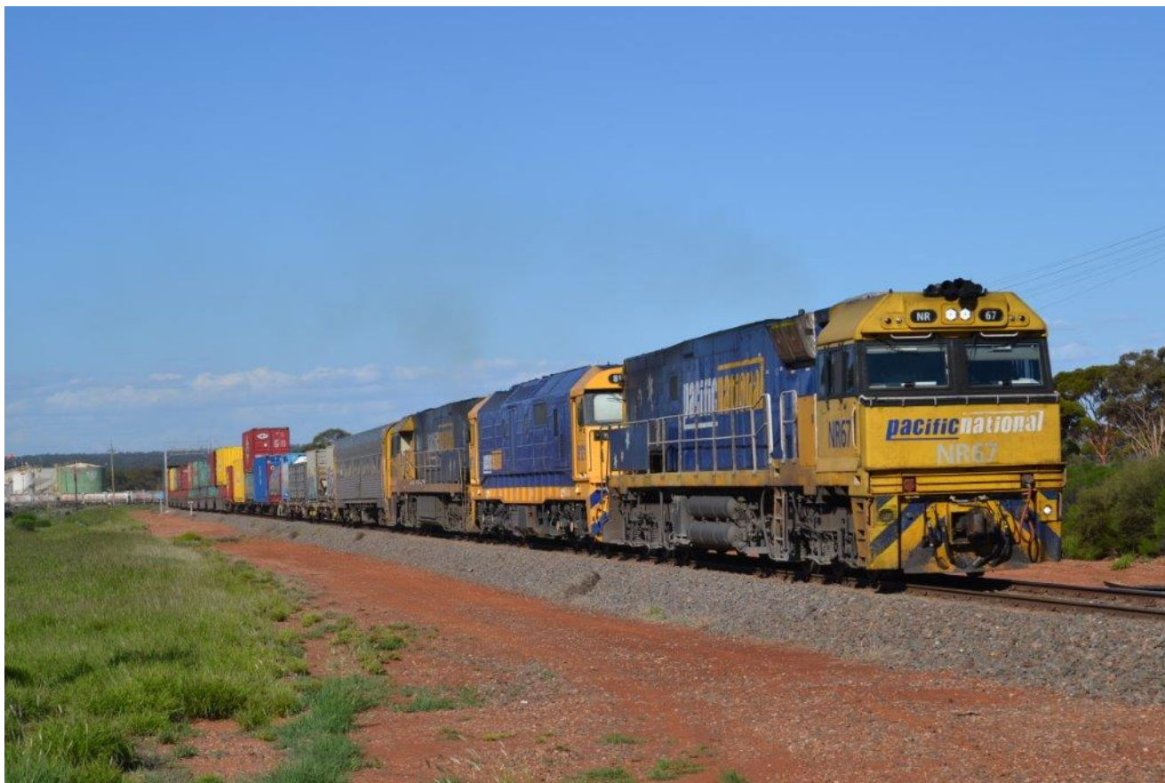
Returning to Perth from workshops attention at Port Augusta, yard shunter 8121 is sandwiched between NRs 67 & 119 on 4MP5 as it departs Parkeston, March 9 th .