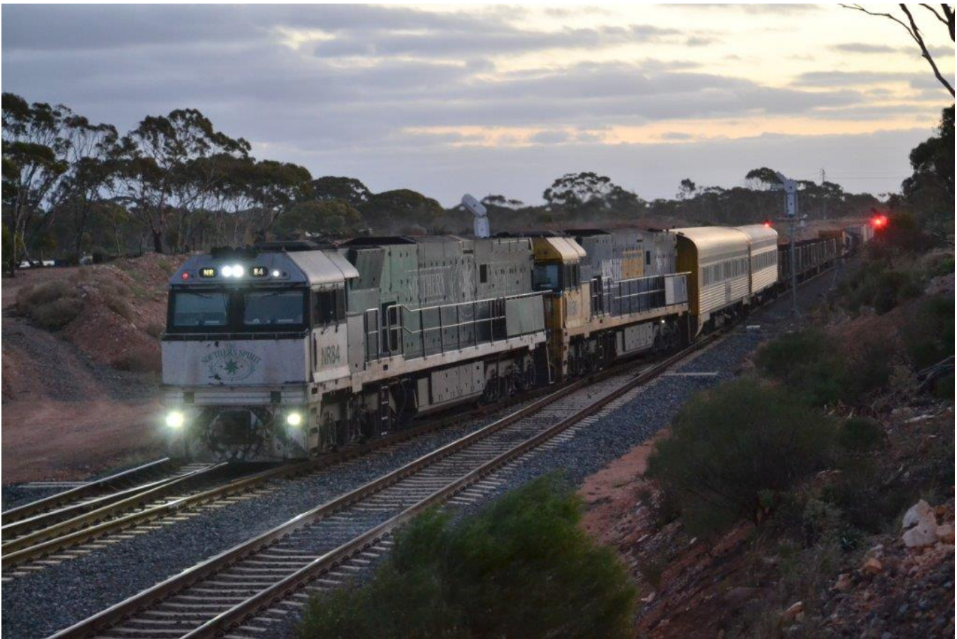
NRs 84 & 30 on 7PX4 approach West Kalgoorlie yard at sunset, March 10 th .