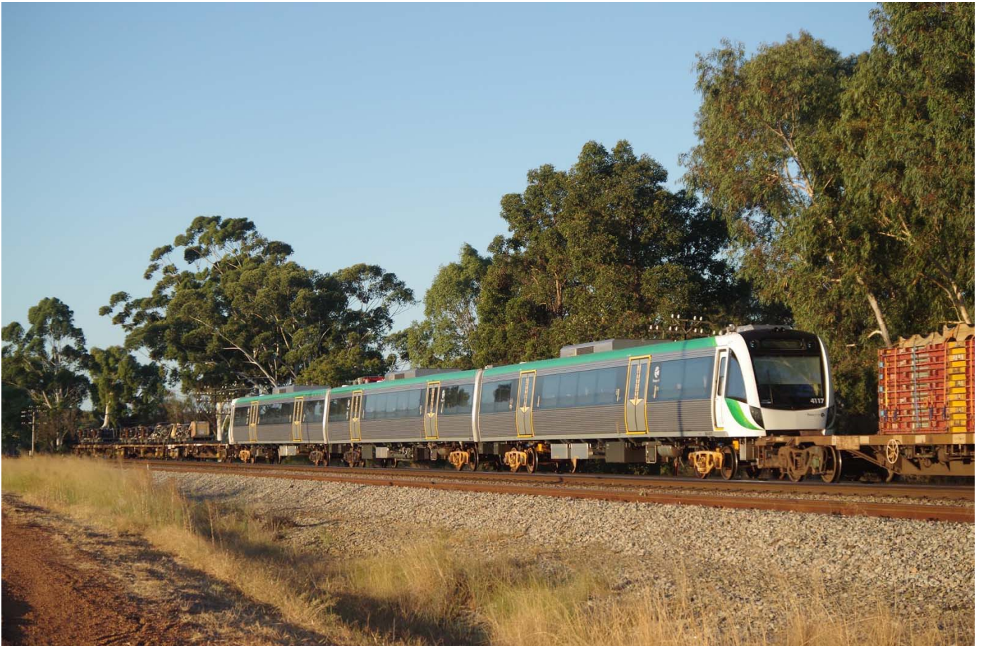
New TransPerth B set #117 on the rear of 5MP2, Millendon Junction, March 11 th .