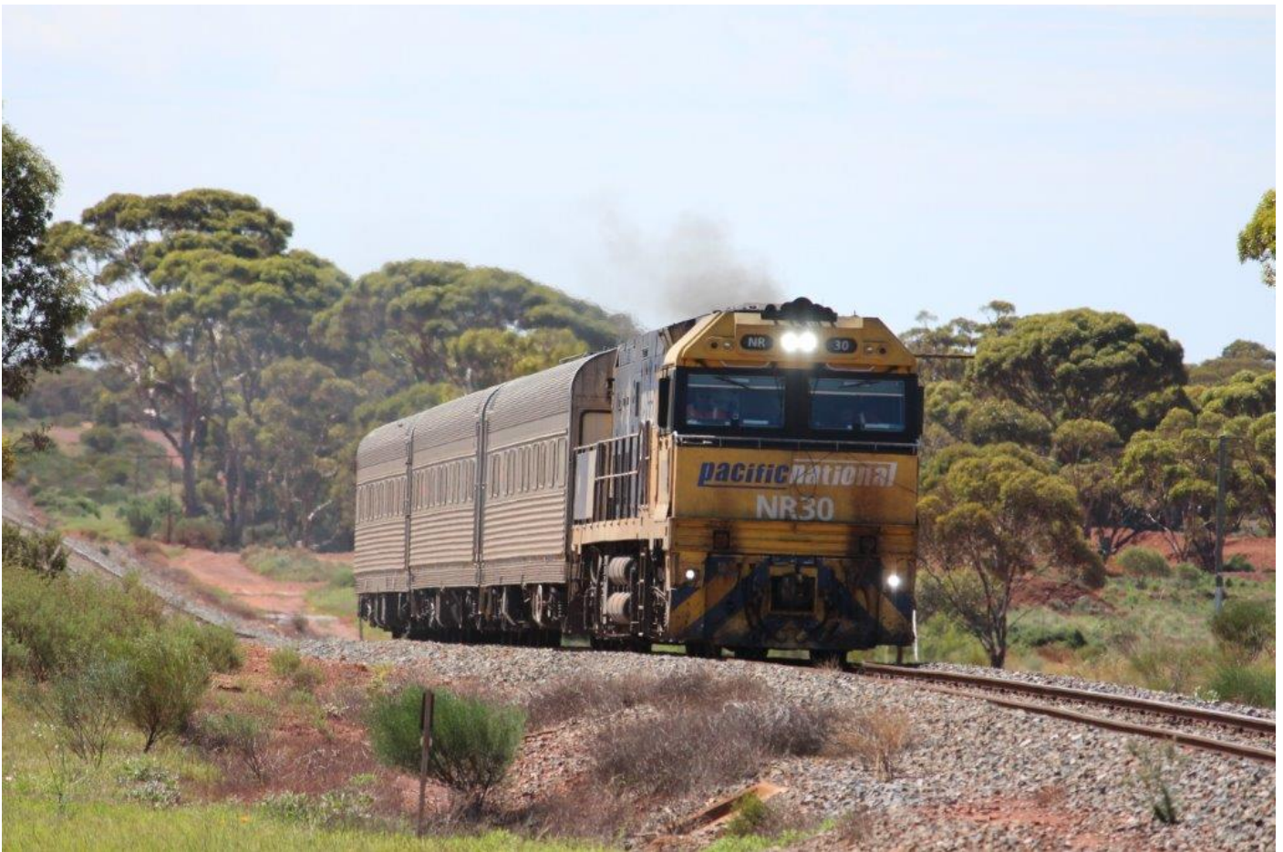
Above and below: NR30 brings 2AK2 “recorder cars” into Kalgoorlie from Leonora, March 5 th.