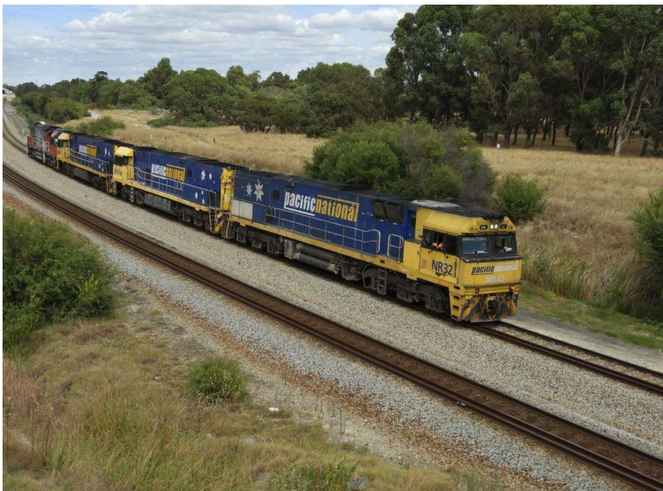
NRs 32, 68, 117 & MRL002 on 3P24 light engine to UGL, South Guildford, March 13 th .