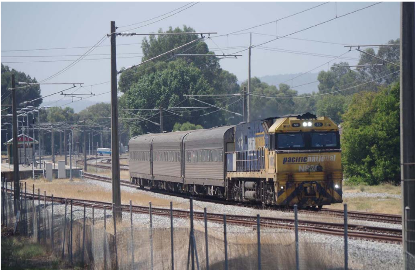
4AK2 passes through Woodbridge behind NR30, March 7th. NR30 had worked it right across the desert.