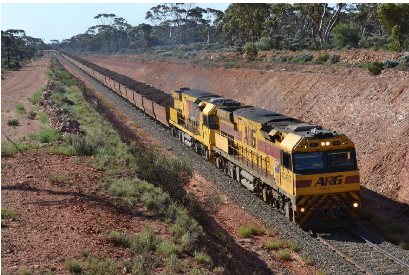
AC4303 & 6022 (DPU AC4308 & 6027) on 7415 ore departing Binduli for Esperance, March 10 th .