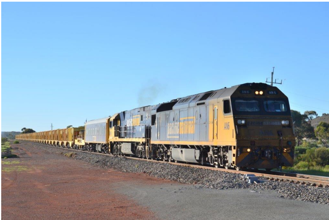
AN6 leads NR9 and the empty ballast in from the desert, Parkeston, March 8 th .