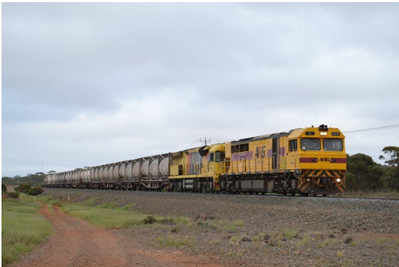
Q4019 & 6029 depart West Kalgoorlie on 1C71 to Parkeston, March 11 th .