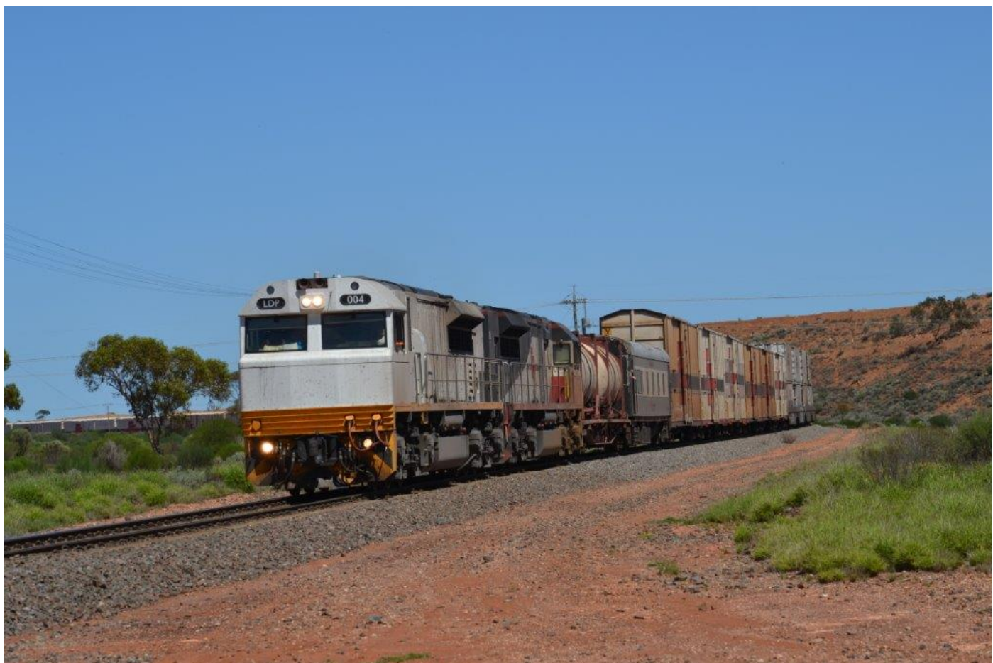
Plain white LDP004 leads SCT002 on 5PM9 towards Parkeston, March 9 th .