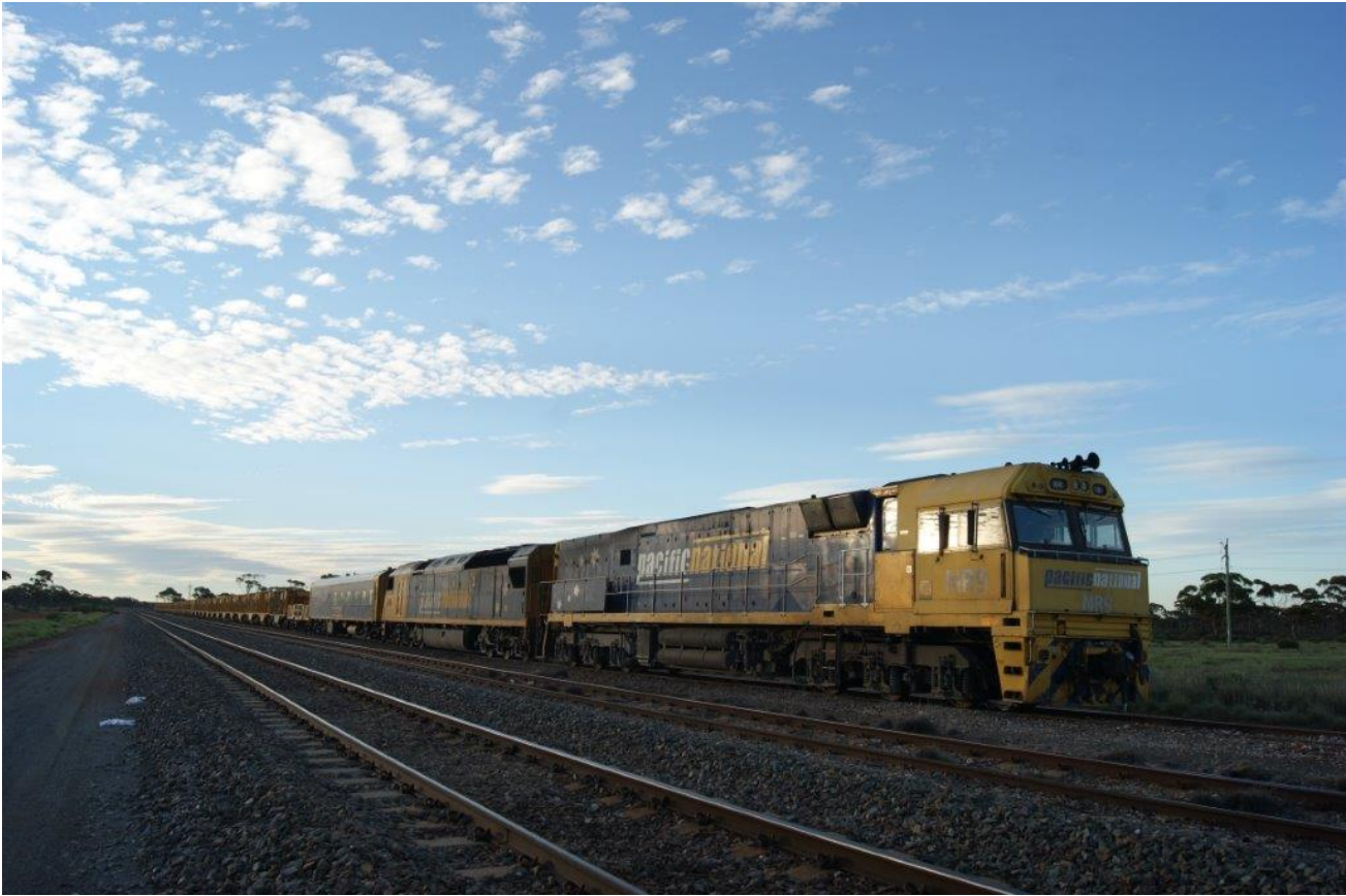
NR9 & AN6 stabled on the ARTC ballast, Parkeston, soon after sunrise, March 16 th.