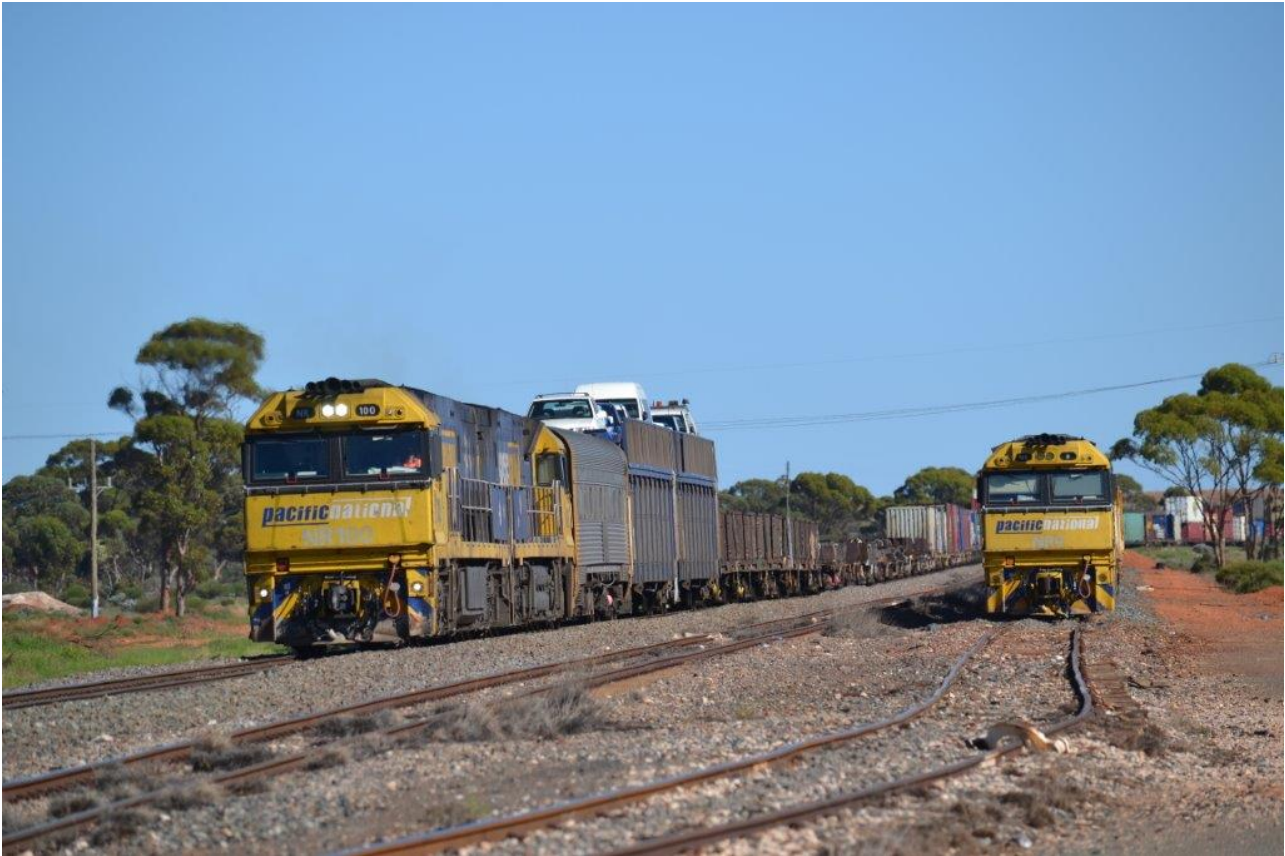
NRs 100 and 93 lead 4PM6 past stabled NR9 & AN6, Parkeston, March 8 th .