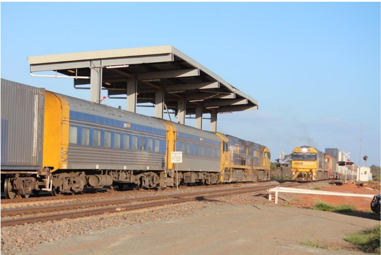
NRs 77 & 91 bring 5MP5 into Parkeston, crossing NRs 10 & 118 on a very late 6PM7. The two trains had just completed a shunt, MP5 donating its crew coach to cover for the failed coach PM7 was hauling, March 10 th .