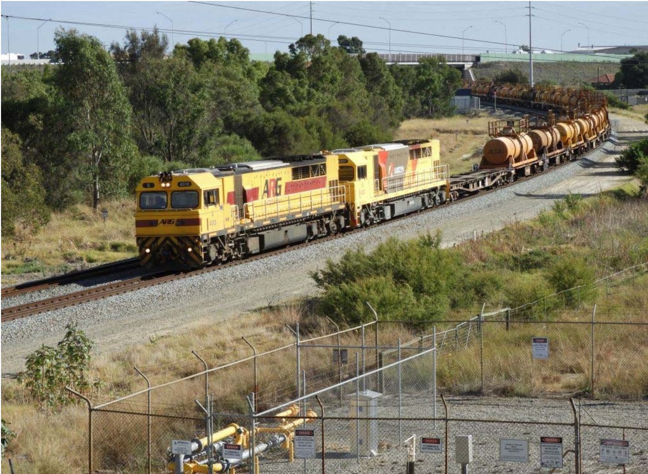
Qs 4010 & 4007 on 2426 freight from Kalgoorlie to Kwinana, Wattle Grove, March 13 th .