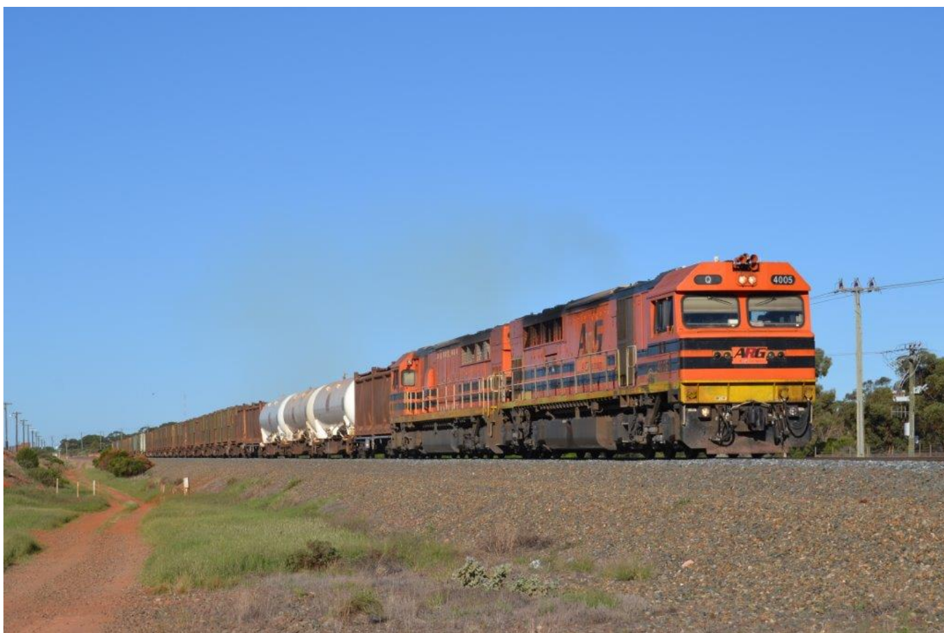
Two of the three remaining orange Qs, 4005 & 4003, lead 4029 sulphur to Malcolm away from West Kalgoorlie, March 8 th .