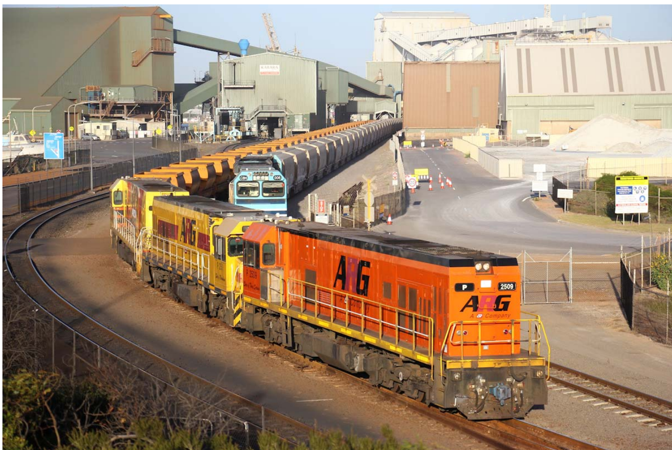
Ps 2509, 2511 & 2504 alongside CBH008 & a sister unit, Geraldton Port, March 9 th .