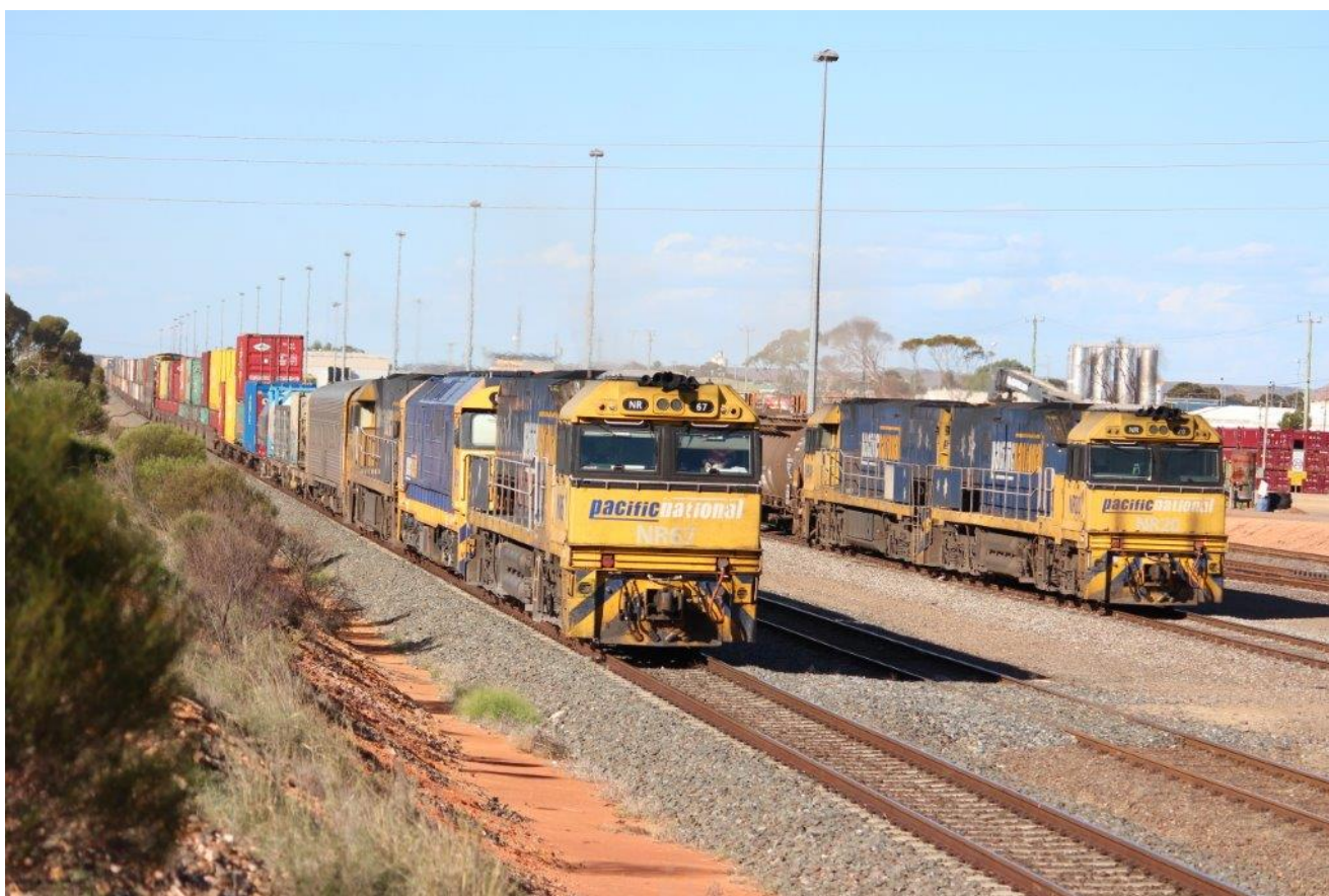
NR67, 8121 & NR119 on 4MP5 arrive on the main at West Kalgoorlie while NRs 20 & 48 stand on the arrival road with 6445 empty fuel to Esperance, March 9 th .