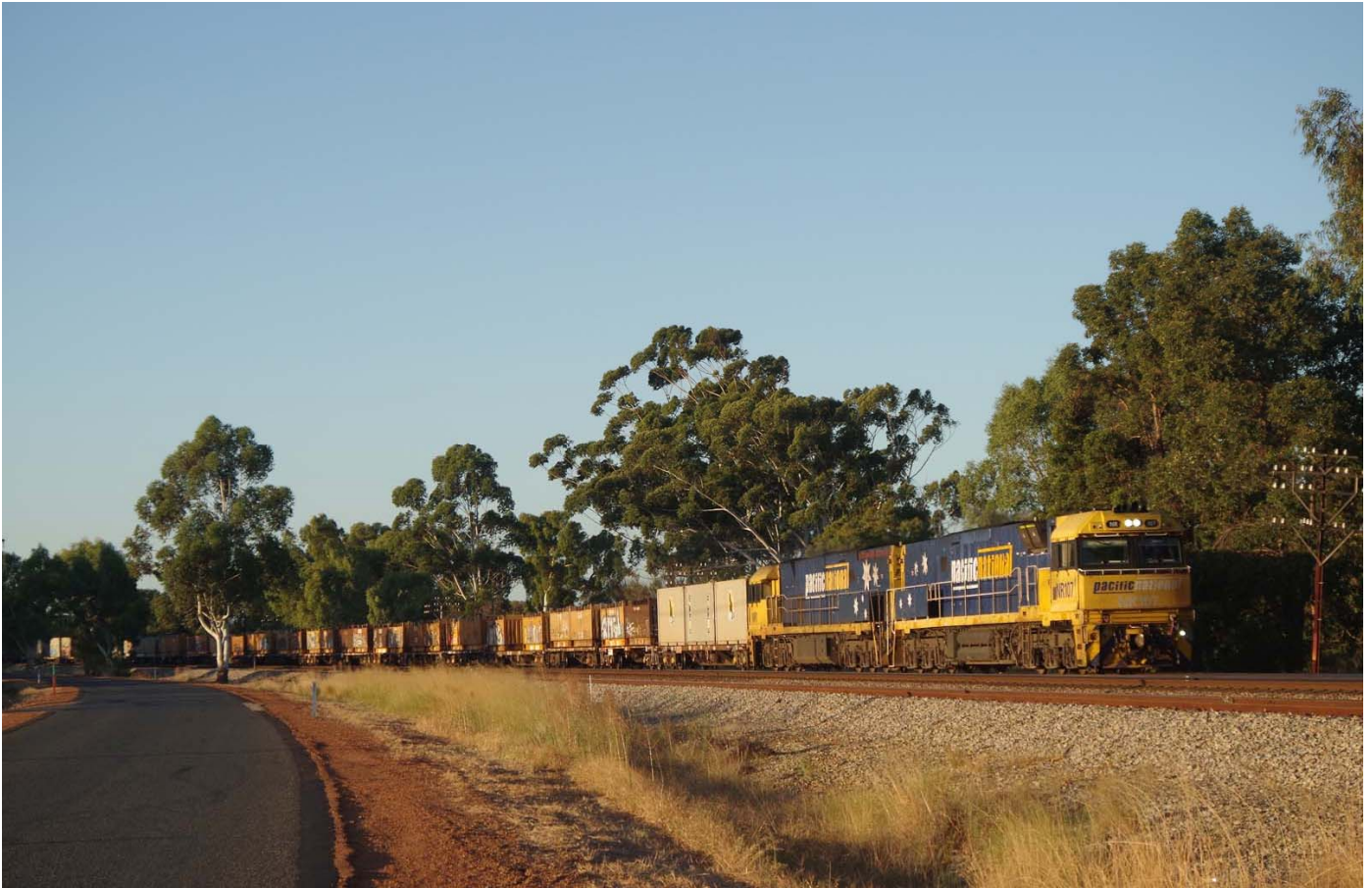
NRs 107 & 1 lead 5MP2 through Millendon Junction, March 11 th .