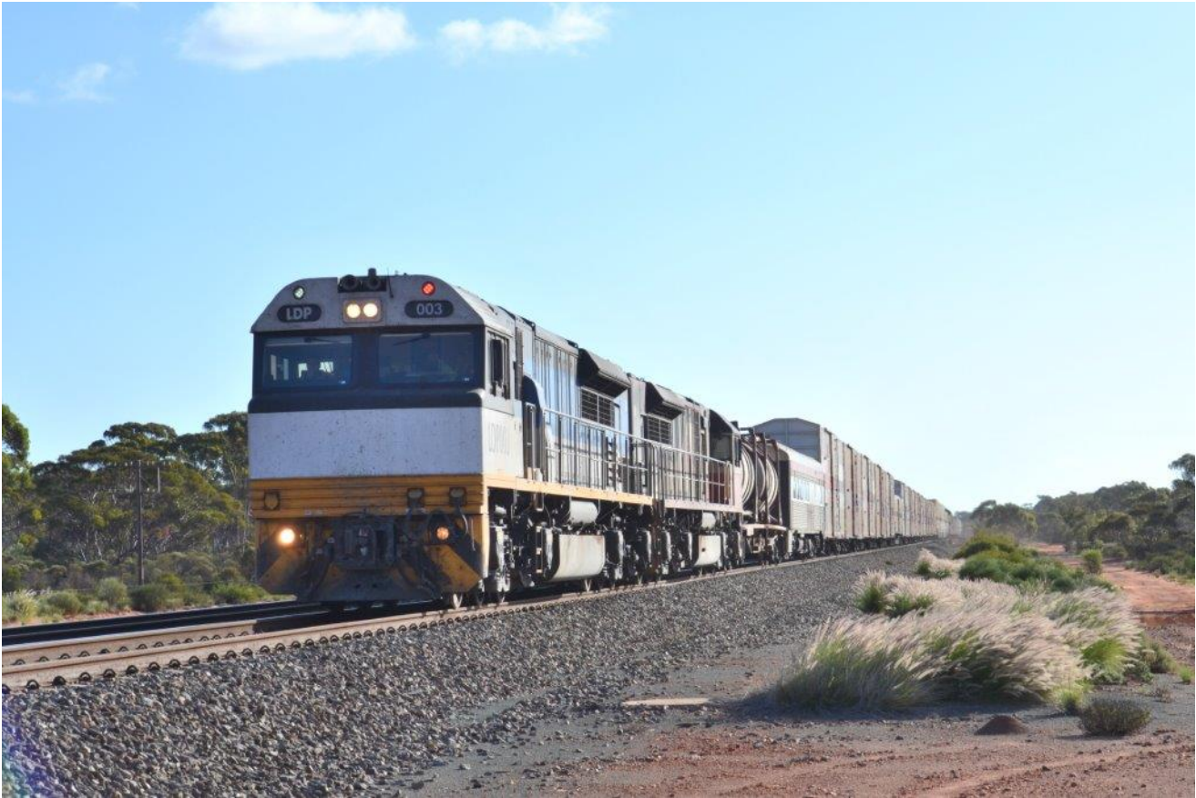
LDP003 and SCT011 on a late 6PM9, Binduli, March 10 th .