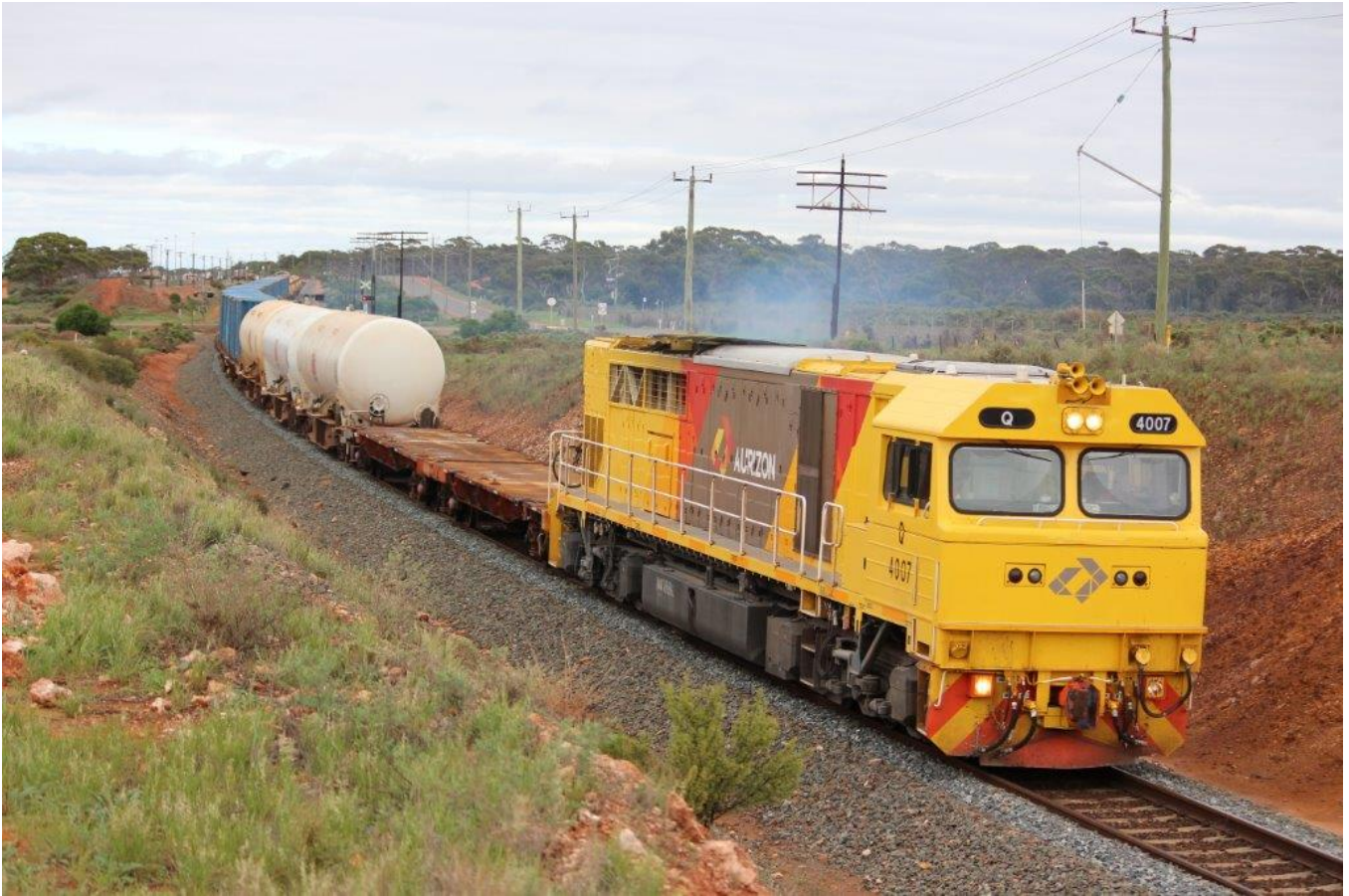
A smoky Q4007 departs West Kalgoorlie on March 3 rd with train 7027, ammonia to Malcolm, but also conveying empty rare earths containers and WN nickel hoppers for Leonora. The usual Leonora train 7479 had not run overnight.