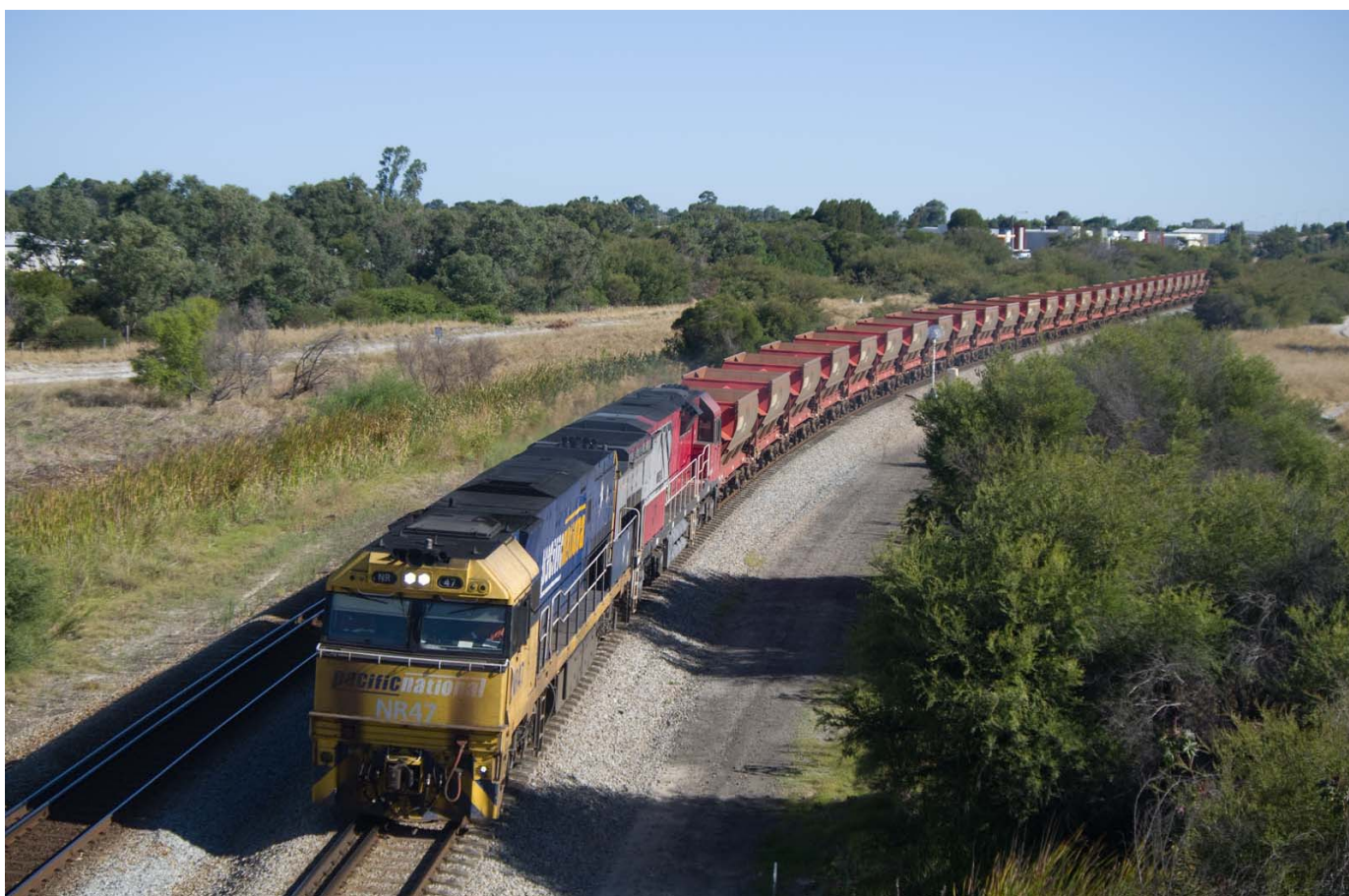
7035 empty ore is led through High Wycombe by NR47 & MRL006, March 3 rd .