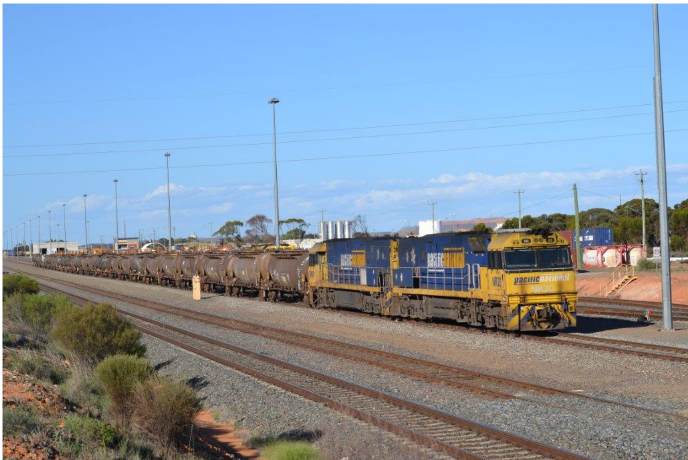
NRs 20 & 49 on 6445 empty Esperance fuel, West Kalgoorlie, March 9 th .