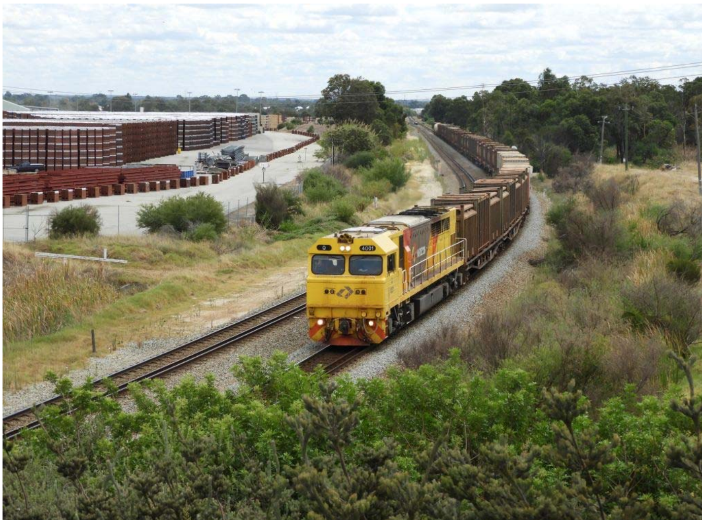
Q4001 leads 5430 empty sulphur from Malcolm through South Guildford, March 16 th .