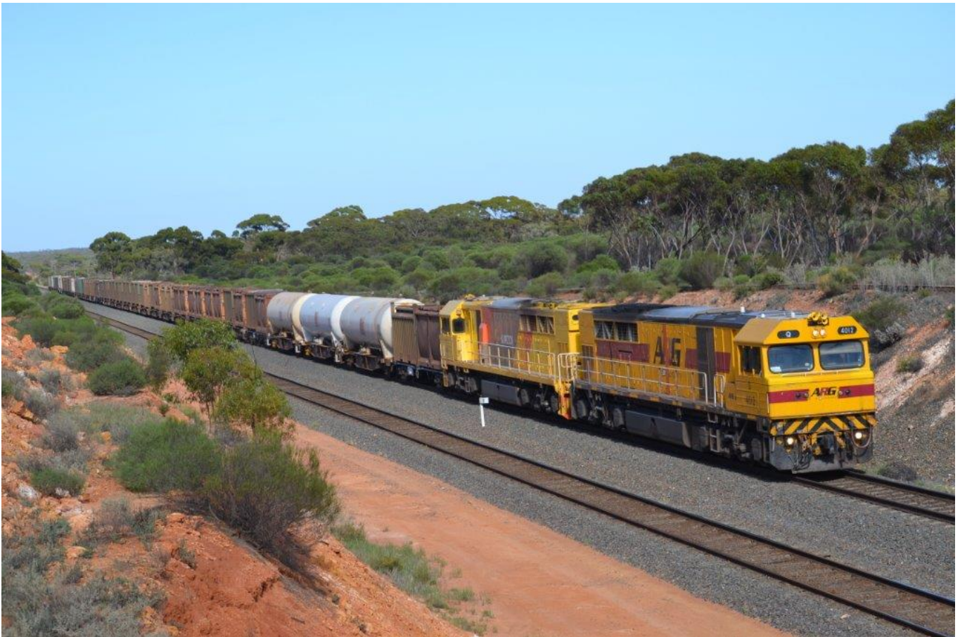
Qs 4012 & 4011 approach West Kalgoorlie with 6029 Malcolm sulphur, March 10 th .