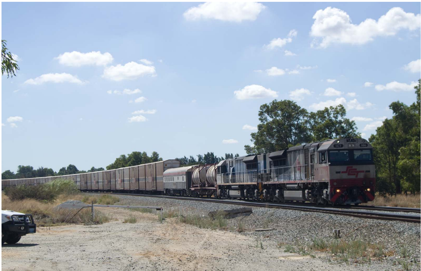
SCT006 and LDP003 work 3MP9 through Stratton, March 9 th .