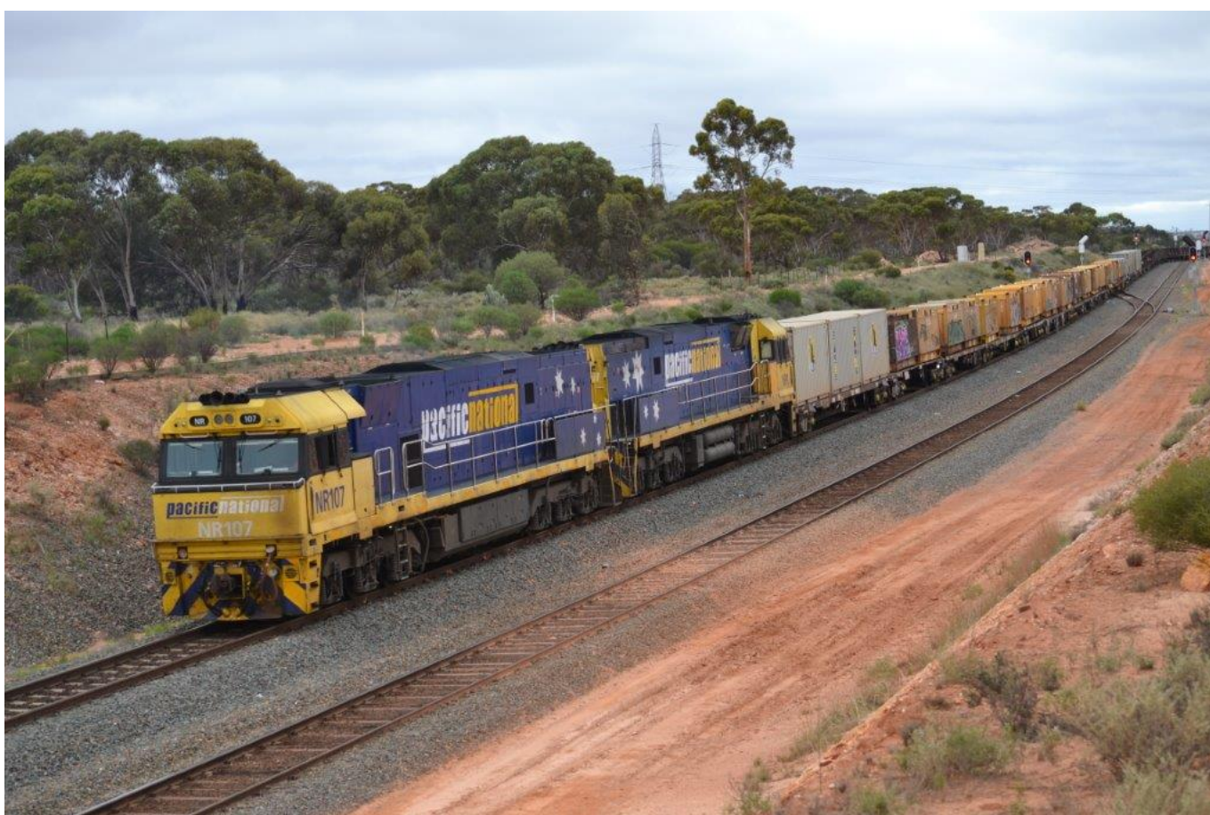
NRs 107 and 1 depart West Kalgoorlie on 5MP2 steel train, March 11 th .