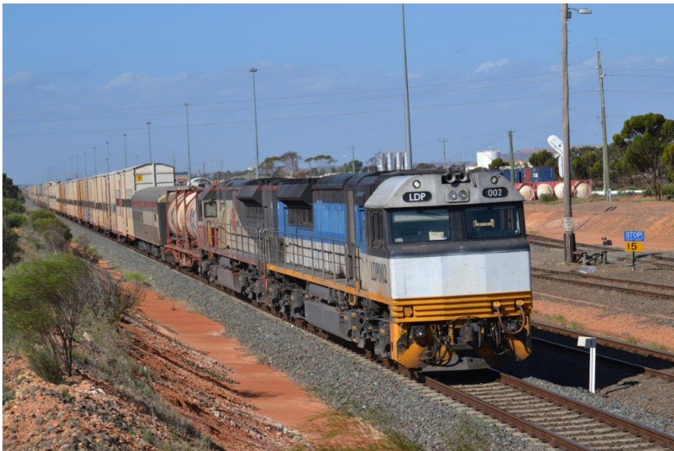
LDP002 & SCT015 on 5MP9 at West Kalgoorlie, March 10 th .