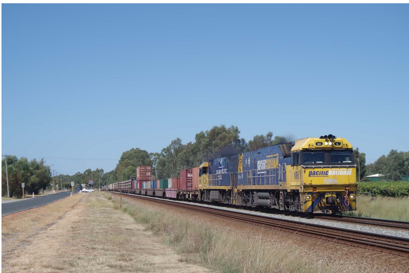
NR6 & NR26 on 1PS6 including a big load of pipes, Herne Hill, March 4 th .