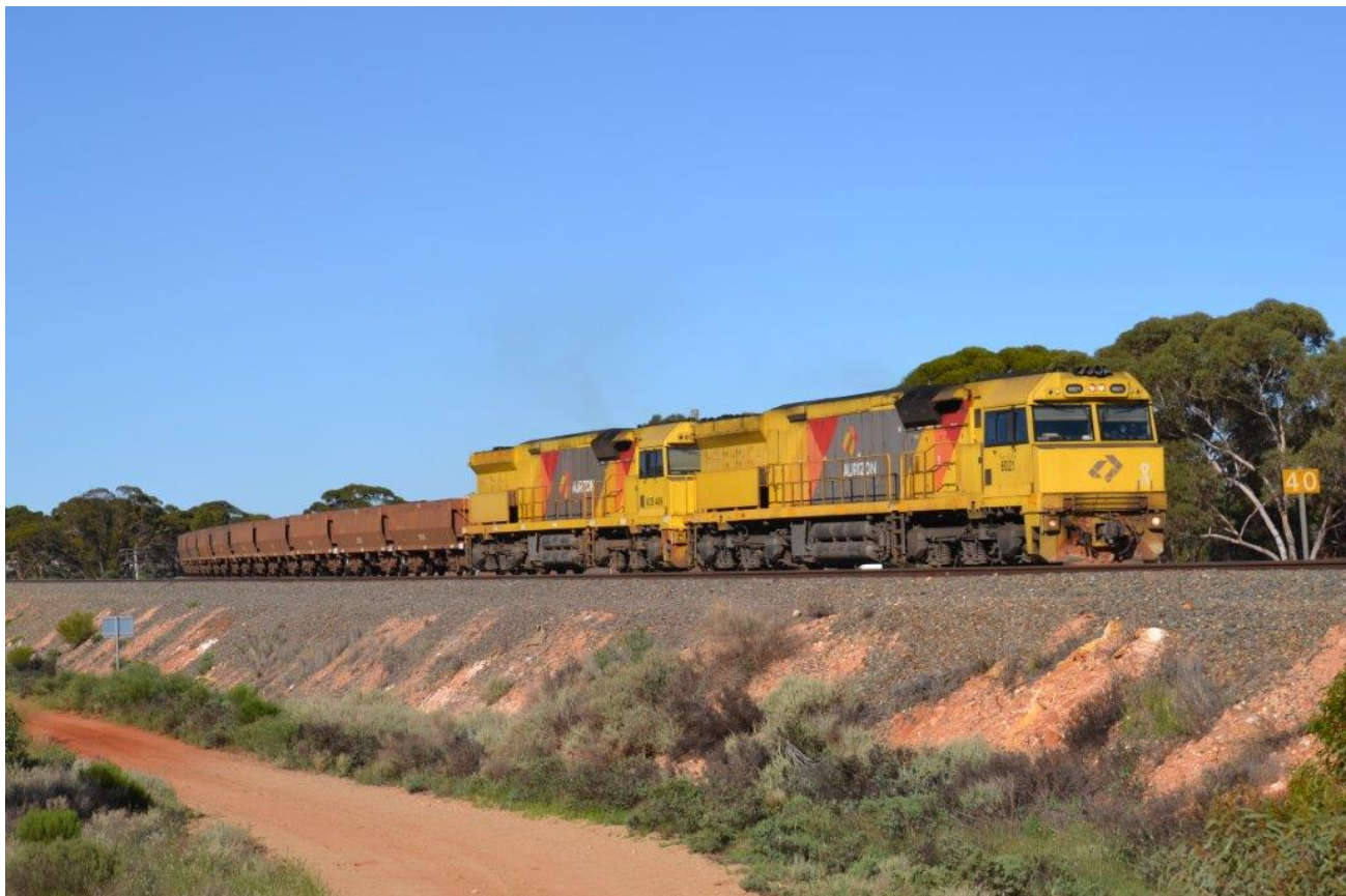
6021 & ACB4406 (6022 & AC4303 DPU), 4414 empty ore rounds the west leg of Binduli, 7/3.