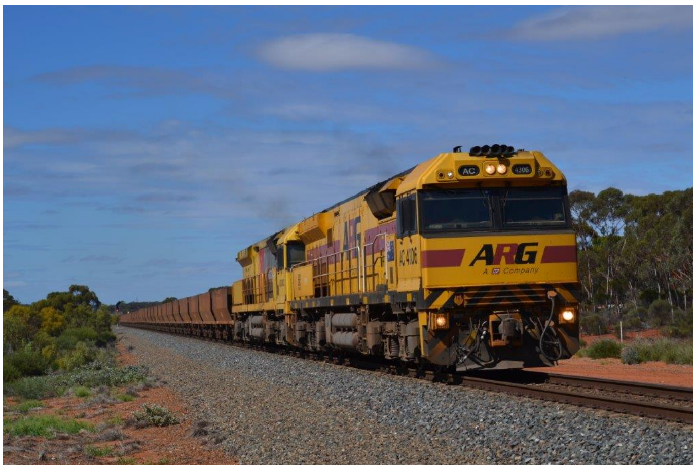
AC4306 & ACC6032 (DPU ACB4405 & 6025) depart Binduli, 1414 empty ore, 11/3. Page 23 of 28