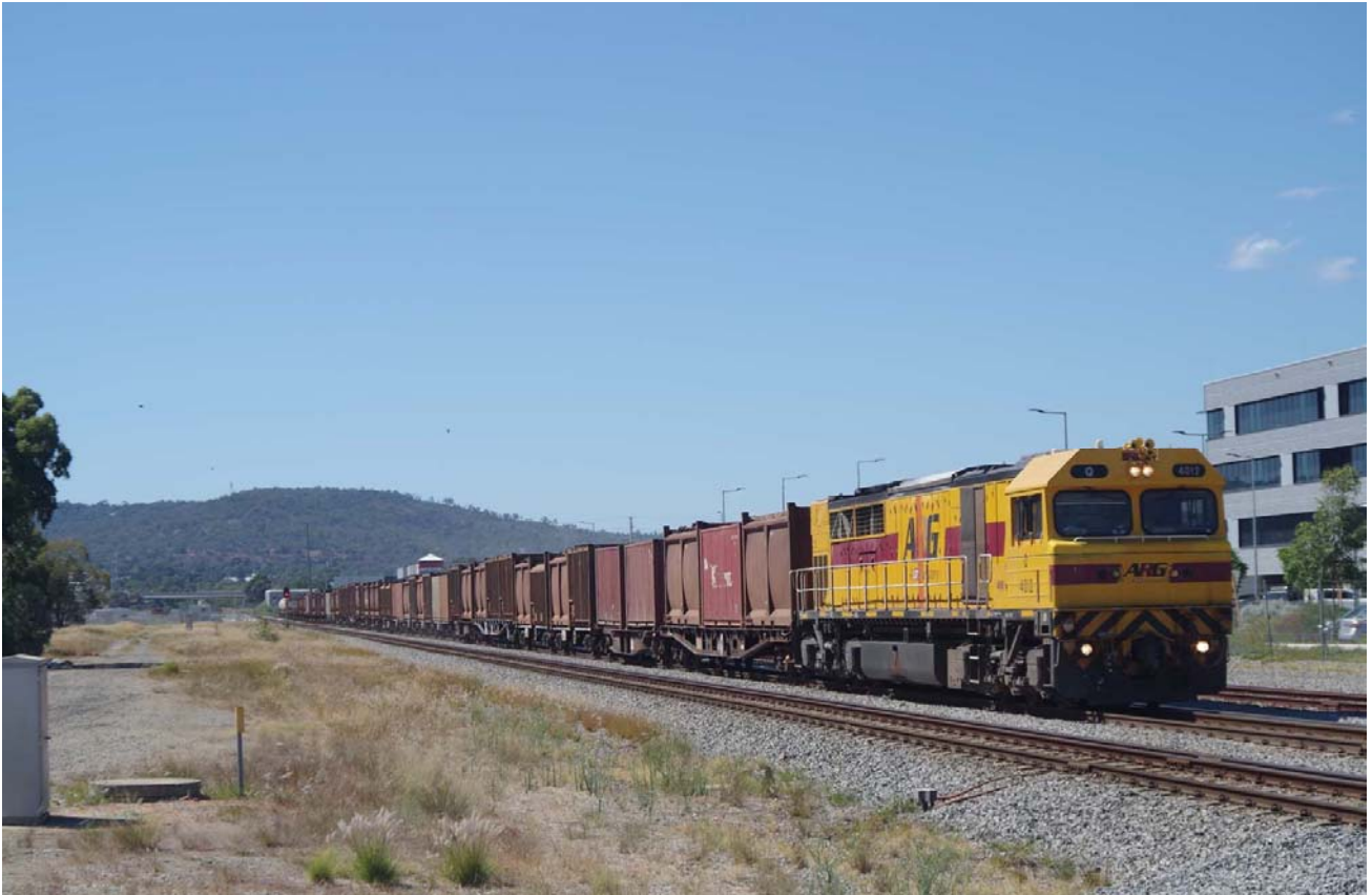
Q4012 on 1430 empty sulphur from Malcolm, passing through Midland, March 5 th .