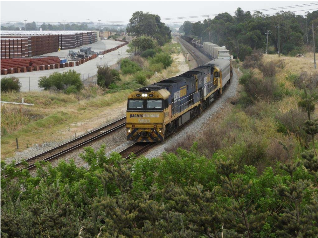
NRs 93 & 100 on 1MP2 steel train, South Guildford, March 7 th .