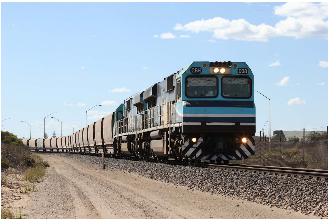
CBHs 008 & 006 lead an empty grain through Beachlands, March 11 th .