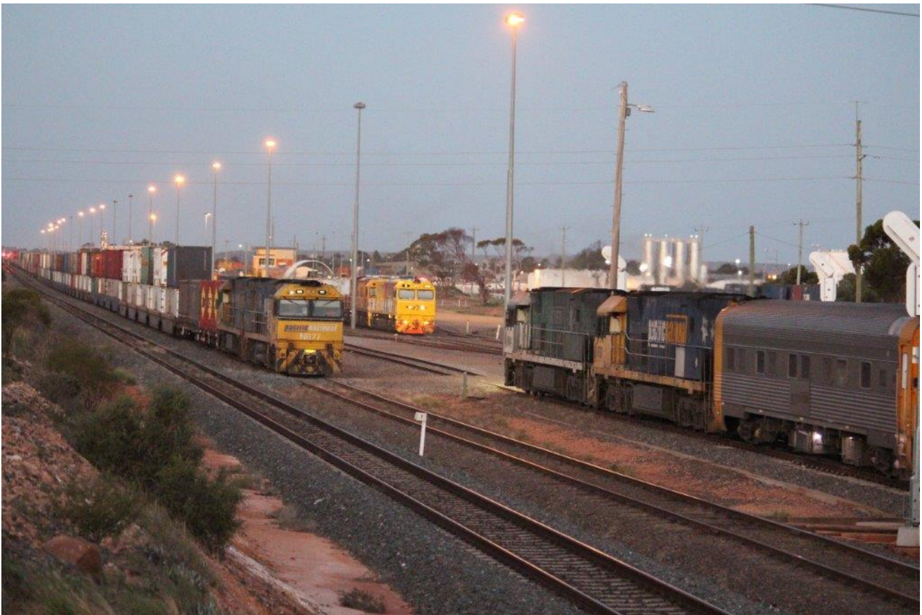
NRs 84 and 30 bring 7PX4 onto the arrival road at West Kalgoorlie on dusk, bisecting NRs 77 & 91 on 5MP5, and Qs 4009 & 4016 on 7426, March 10 th .