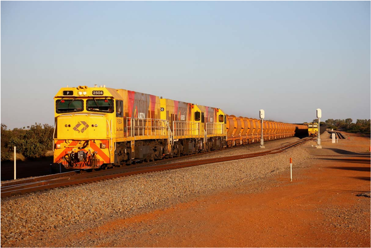
Beautiful light bathes P2504, P2505 and P2517 on 6725 loaded ore at Northern Gully, March 2 nd .