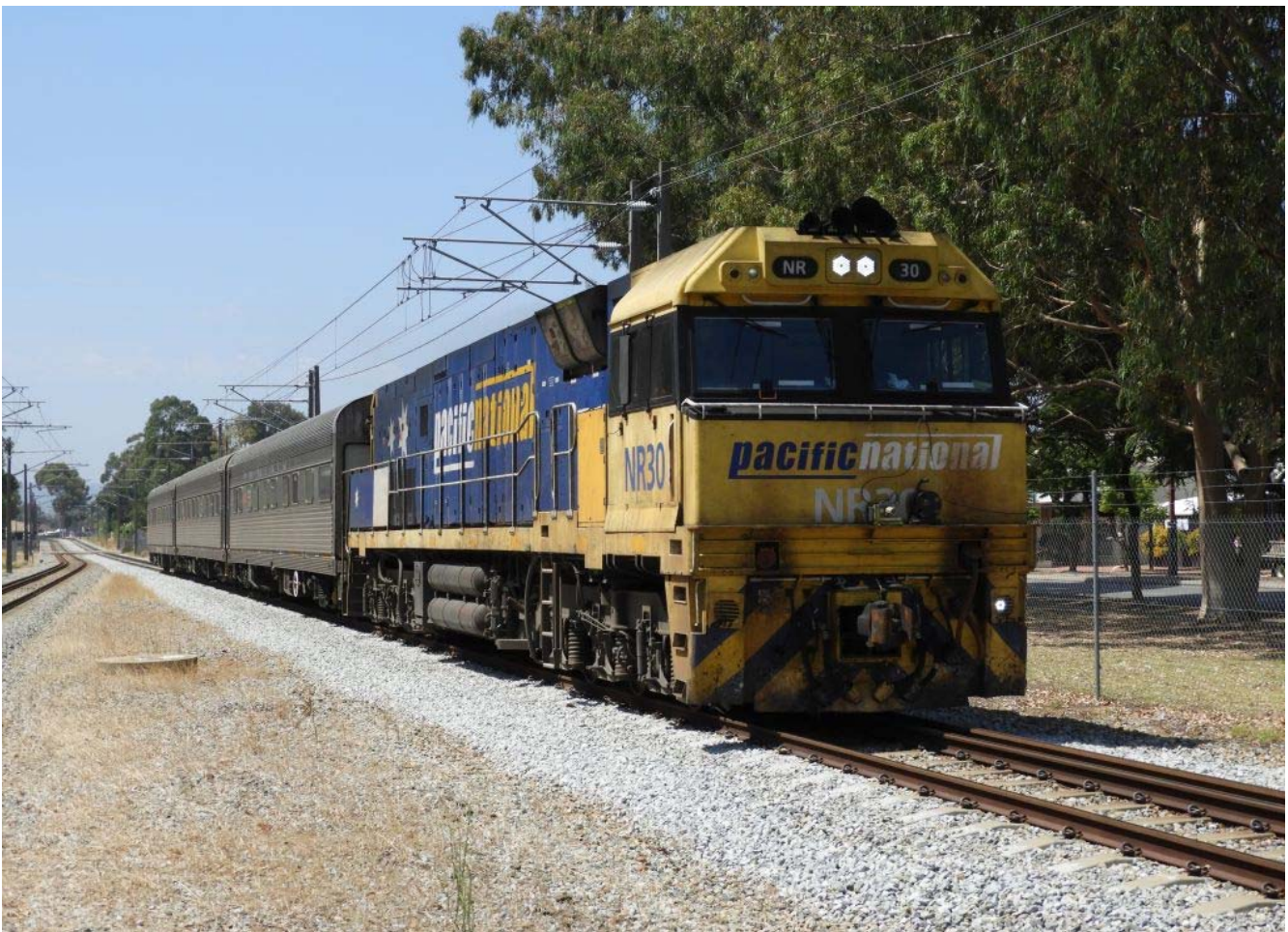
4AK2 track inspection train to East Perth at East Guildford, March 7 th .