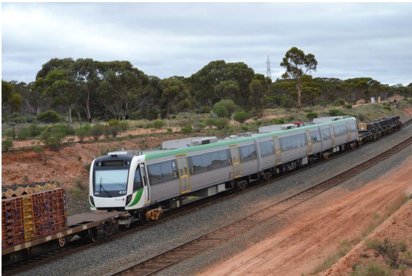
First of an order for ten new TransPerth suburban trains, set 117 on 5MP2 departing West Kalgoorlie, March 11 th .