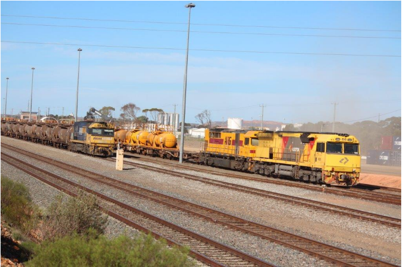
Faulty NR11 was removed from the Esperance fuel train at West Kalgoorlie, leaving NR105 solo; NR53 was dropped off by 7MP5 a few hours later to replace NR11 prior to 2445's departure. 6029 & Q4014 stand at the head of 2426 to Perth, March 5 th .