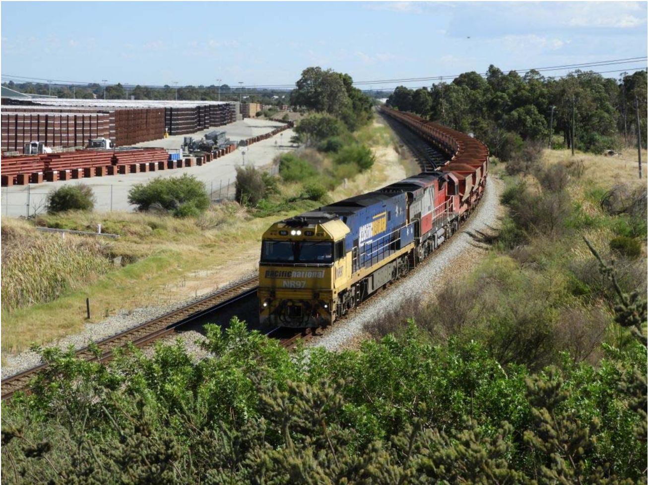
NR97 & MRL006 lead 1032 Polaris ore through South Guildford, March 5 th .