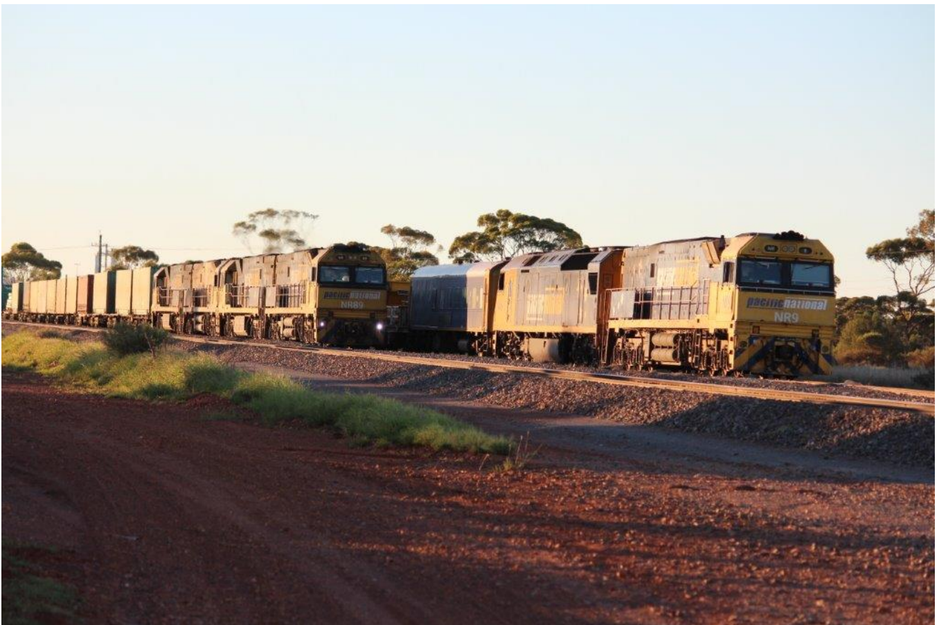
NRs 89, 23, 18 and 94 on late 2PM5 pass stabled NR9 & AN6 on ARTC ballast, Parkeston, 6/3. Page 8 of 28