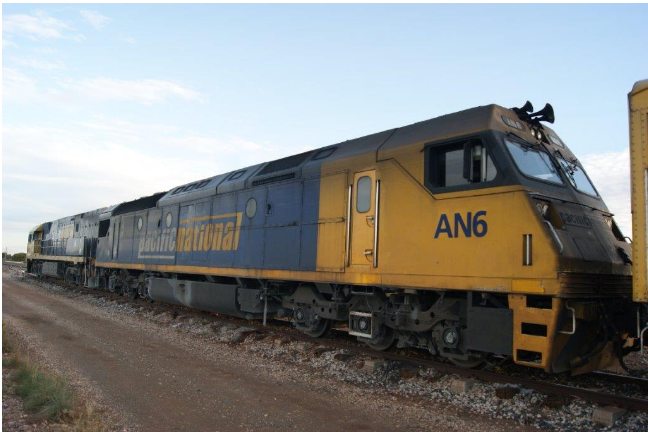
AN6 stabled on the ARTC ballast at Parkeston, March 16 th .