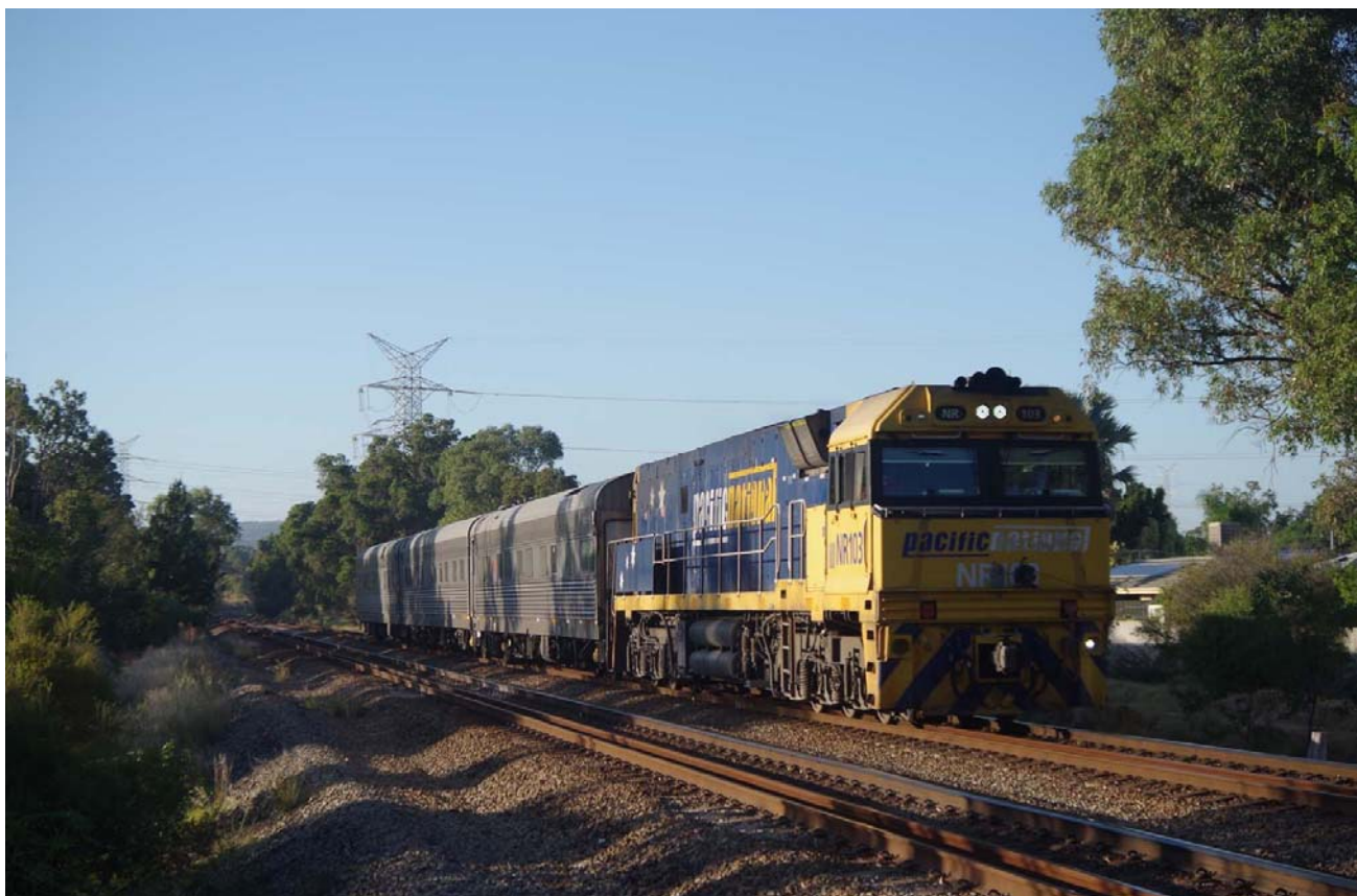
Finally, a change of loco! NR103 leads 6AK1 through Swan View, March 9 th . Early on 11/3, NR6 on 6PM7 seized an axle at Cook; NR103 was removed from the AK cars to replace it. A few hours later, 7PX4 arrived with NR84 hauling NR30 – with the latter being pinched to haul the AK cars once again!