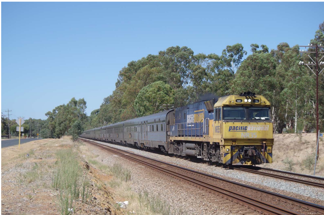
1PA8 Indian Pacific races through Middle Swan behind NR35, March 4 th .