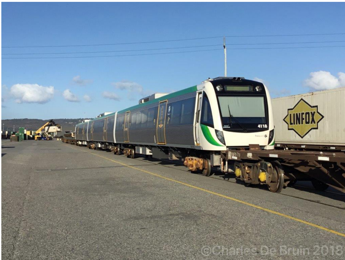
TransPerth B set 118 at Kewdale, awaiting transfer to Midland for bogie exchange.