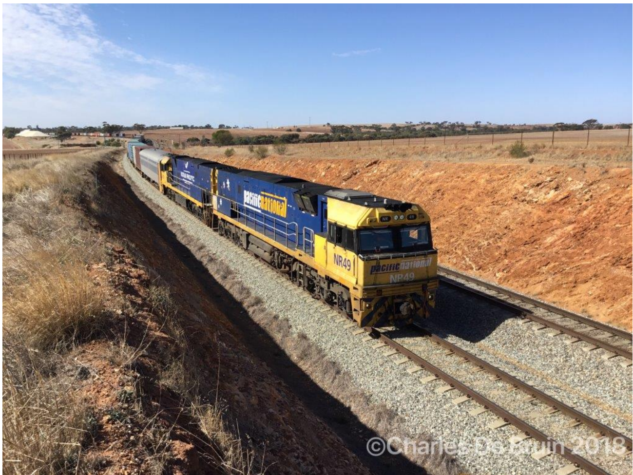
NRs 49 & 29 wait on a very late 7MP5 at Grass Valley to be overtaken by the Prospector, 8 th May.