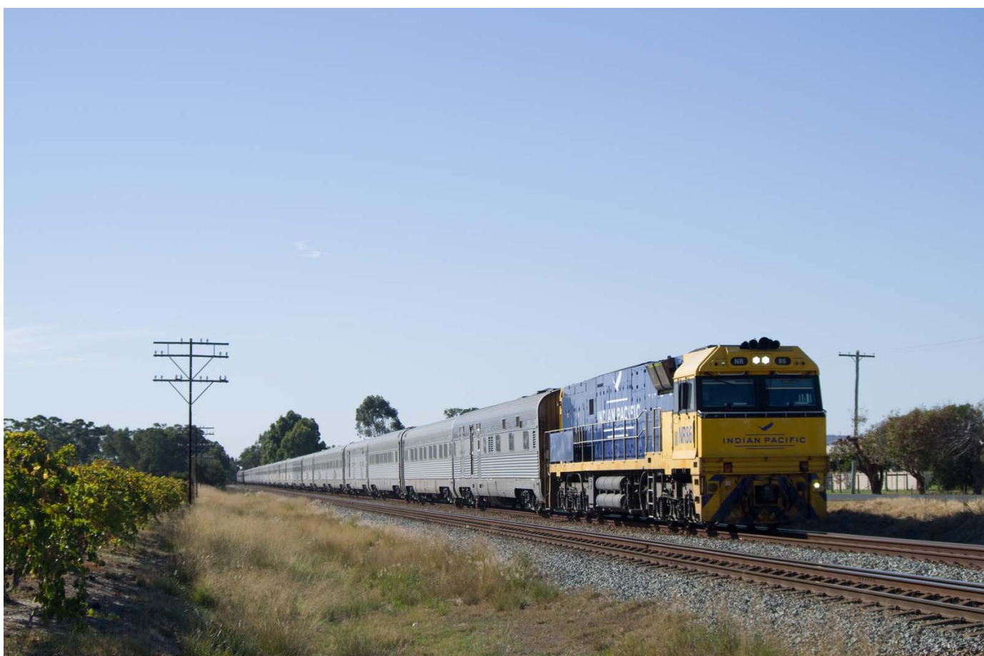
Another to receive Indian Pacific mark III signage recently, NR86 leads 5AP8 through Herne Hill, 5 th May.