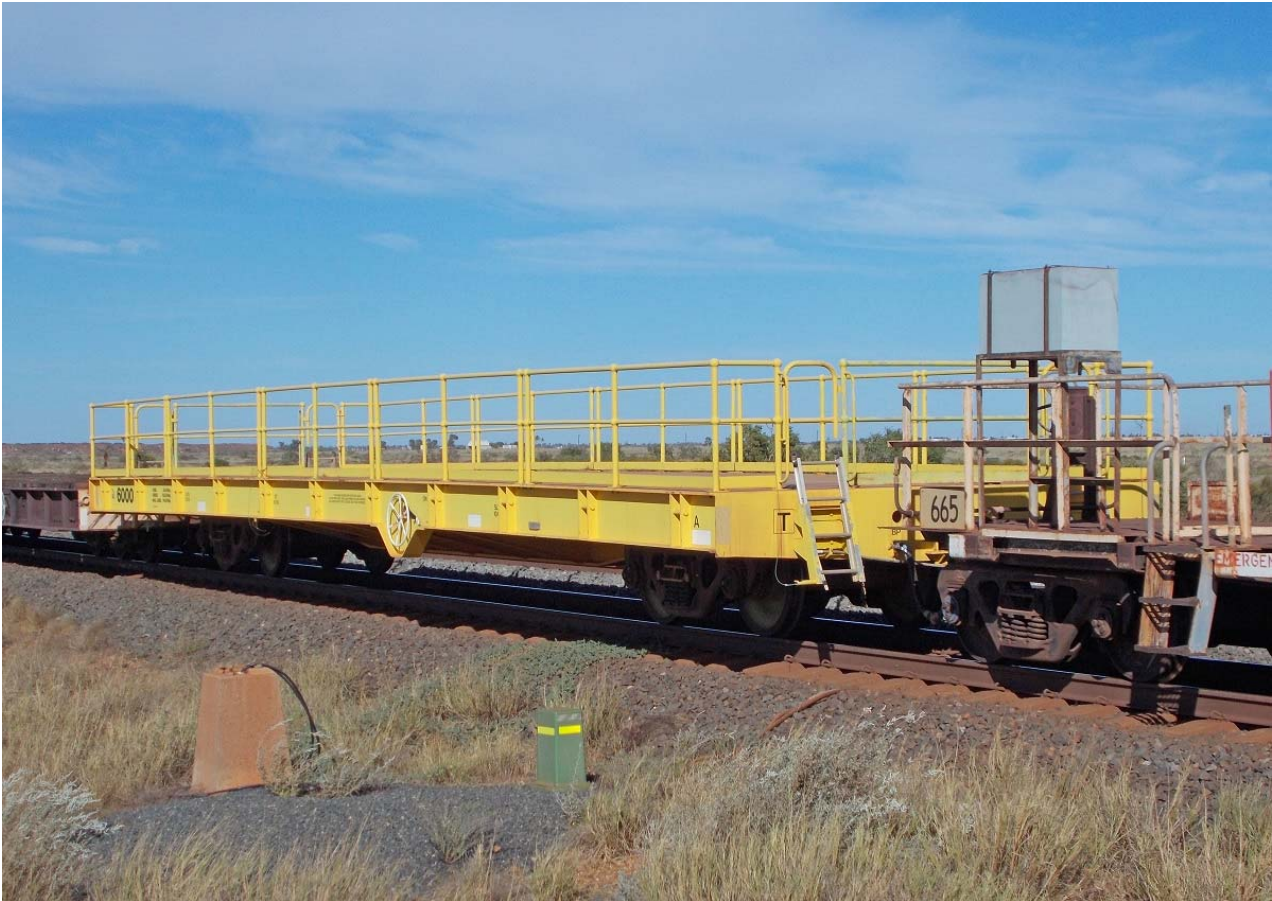
A little out of gauge for most railways – “Jumbo” car 6000, built by Gemco in Perth for hauling bridge sections during duplication works. 17 th May.