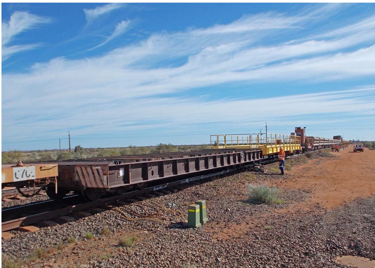
Shunting the rake of obsolete wagons, 17 th May.