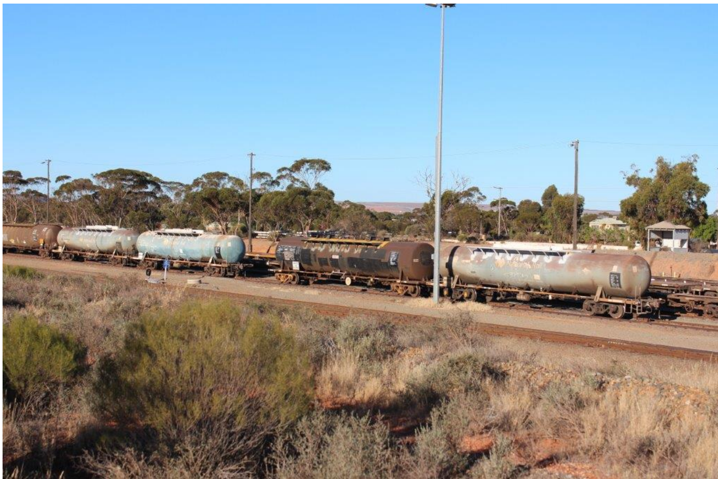
Several more RTHY tank wagons have been transferred west in recent weeks for Esperance-Cook fuel traffic, five or six have now arrived. Three are in West Kalgoorlie yard with noticeable upper body modifications, 18 th May.