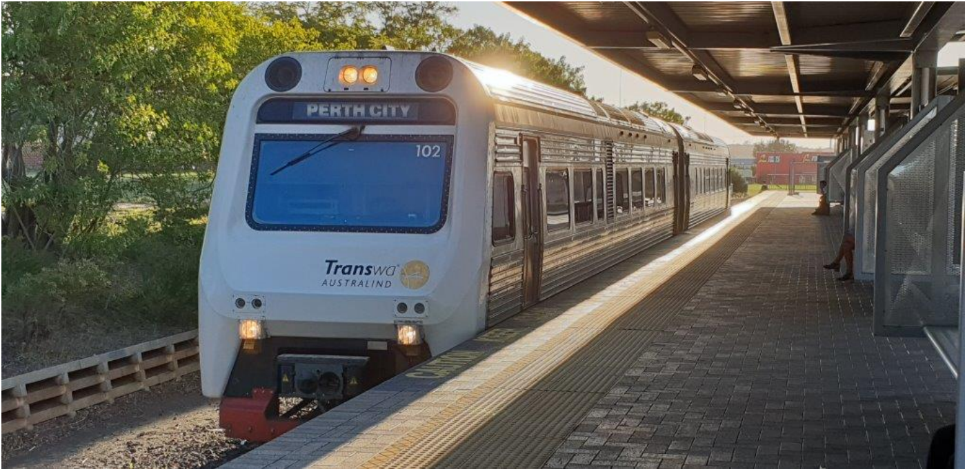
ADPs 102 and 103 form 7150 Australind at Bunbury station, 12 th May.