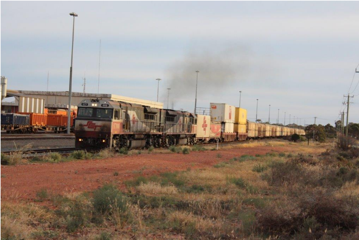
SCT008 leading 5PM9 failed en route to Kalgoorlie; the train was divided at West Kal and taken to Golden Ridge in two parts to stable until late the following morning to await a replacement loco ex 6PM9. SCTs 008 (dead) and 011 depart West Kalgoorlie late afternoon with the second portion, the first half ran as 8855s, locos returned as D856s, 4 th May.