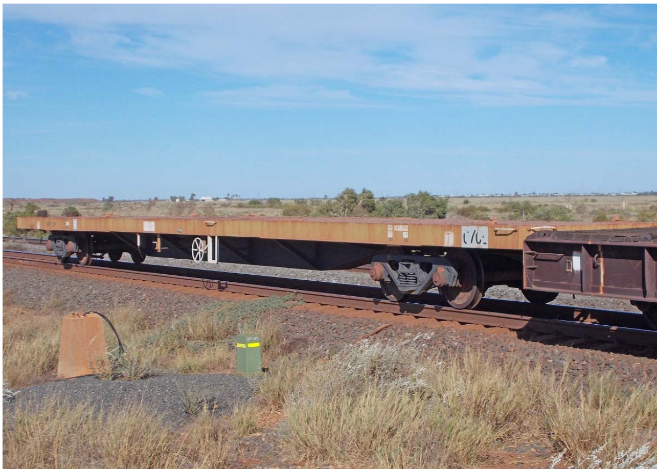
Ex-AQPY2916V, converted from a CR/AN AOOX “gondola” wagon prior to sale to BHP.