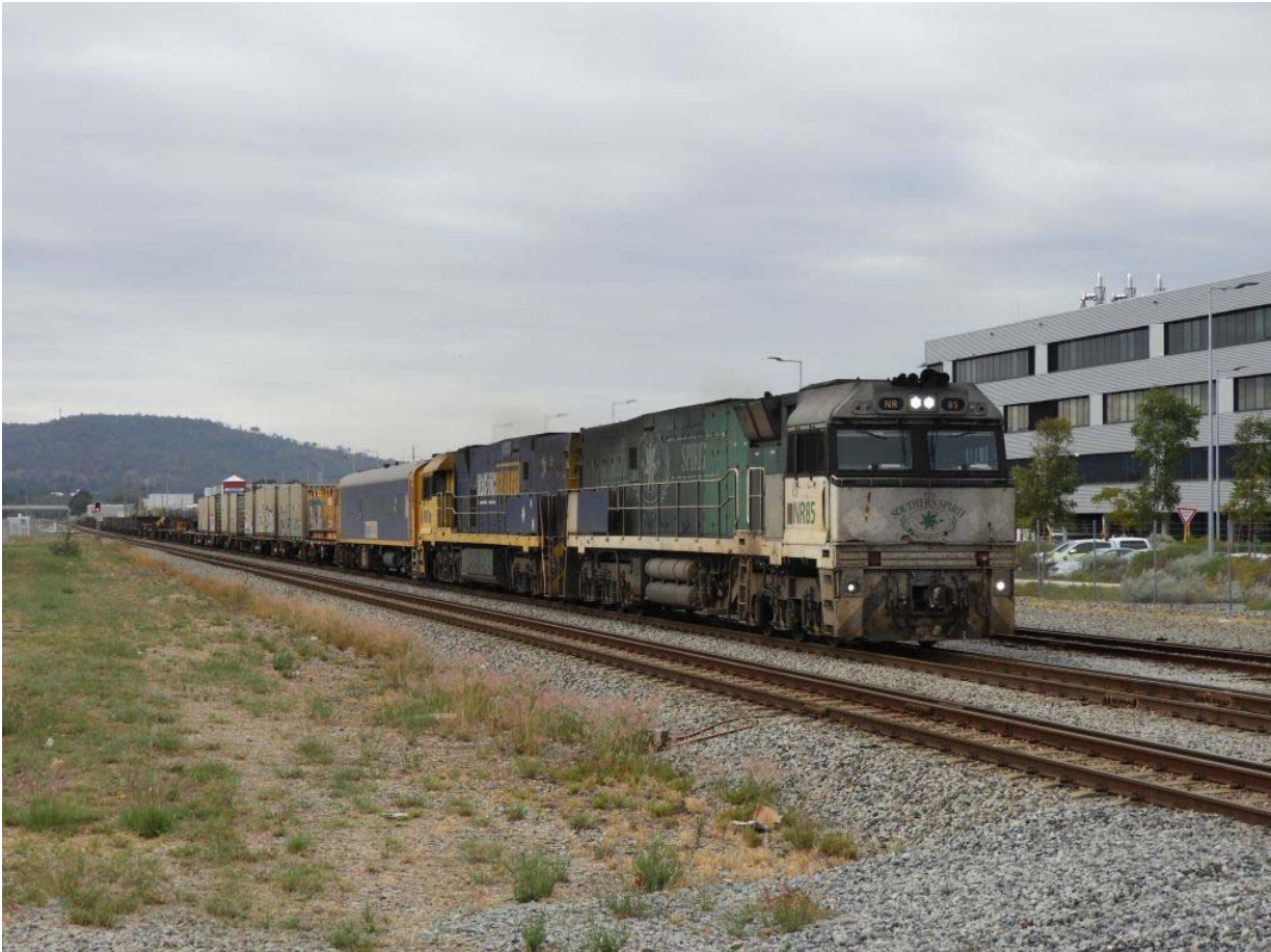
NRs 85 & 87 on 1MP2 steel, Midland, 2 nd May.