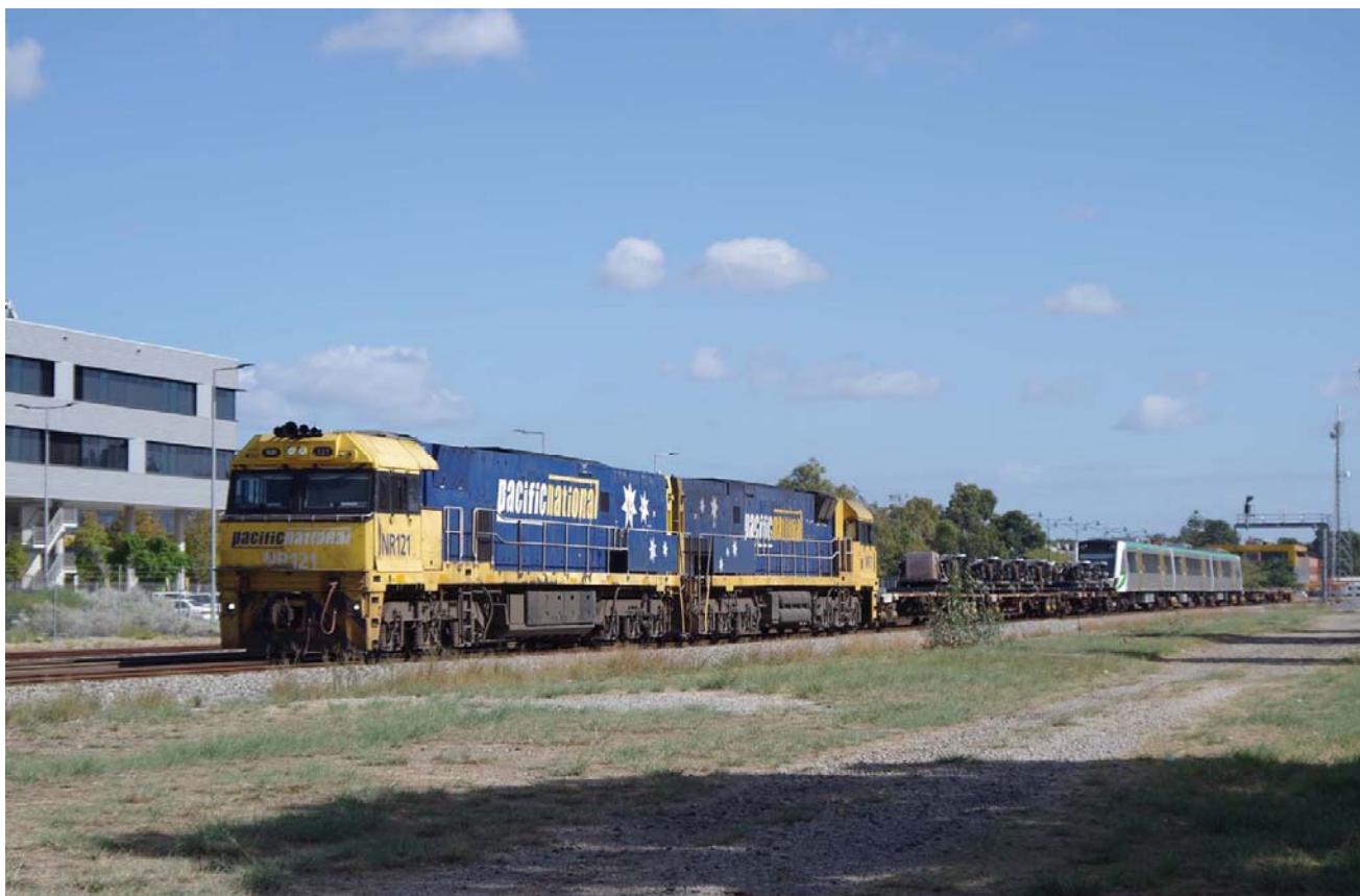
NRs 121 & 7 work 6P31 shuttle, conveying set B118 for gauge transfer, 3 rd May. Page 7 of 28