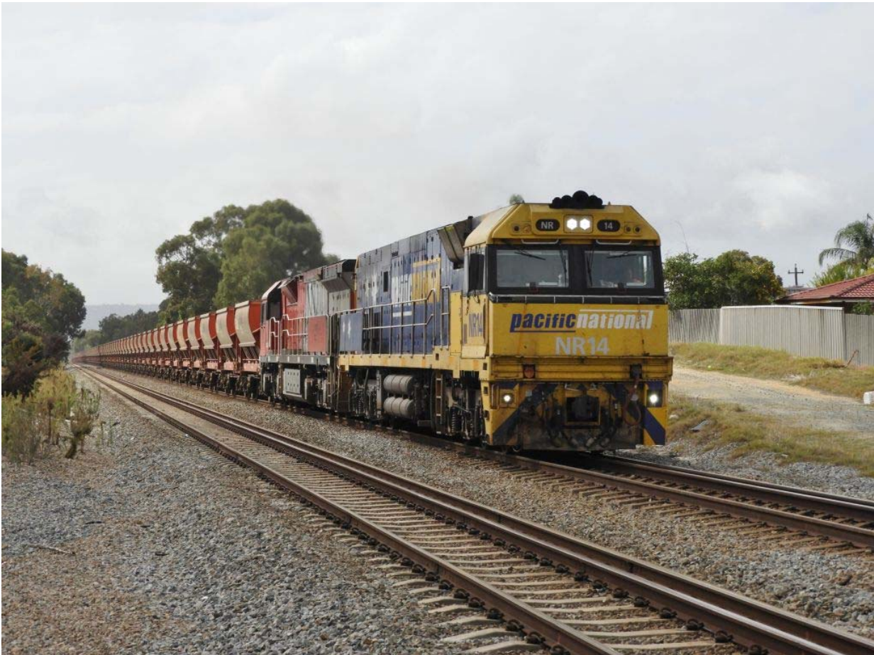
NR14 and MRL003 haul 3030, the final loaded Polaris ore, through Thornlie, 2 nd May.