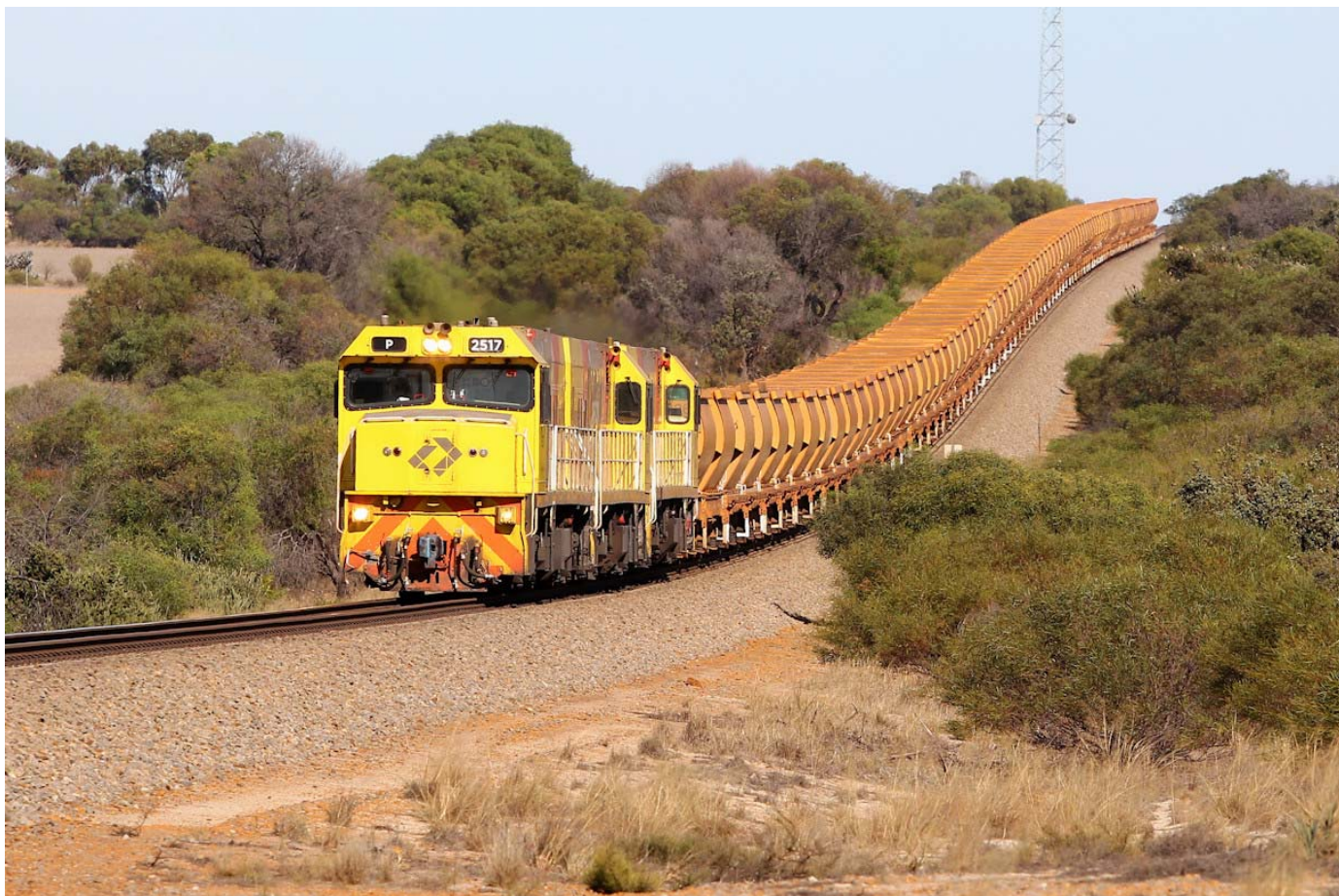
Ps 2517, 2505 & 2513 lead 7720 ore through the roller coaster at Kojarena, 5 th May.