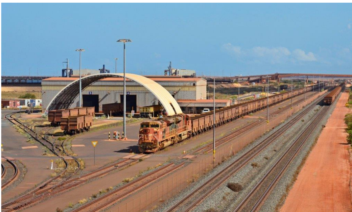
4416 & 4315 on an empty rake at Boodarie after tipping, 1 st May. The locos will be exchanged for a fresh pair before the train sets off for another trip to the mines.