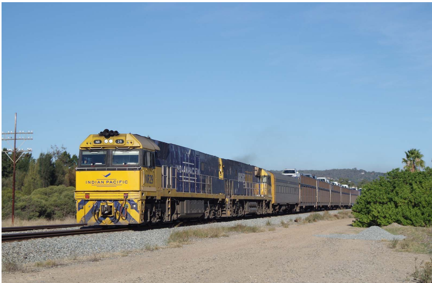
7PM5 passes through Stratton behind NRs 29 & 92 on 28 th April.