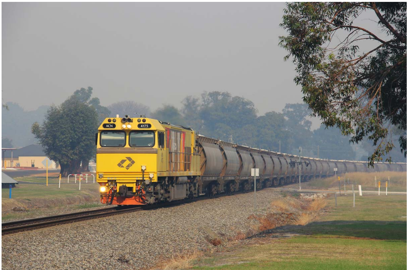
ACN4175 leads an empty alumina train through smoke from controlled burns, Yarloop, 11 th May.