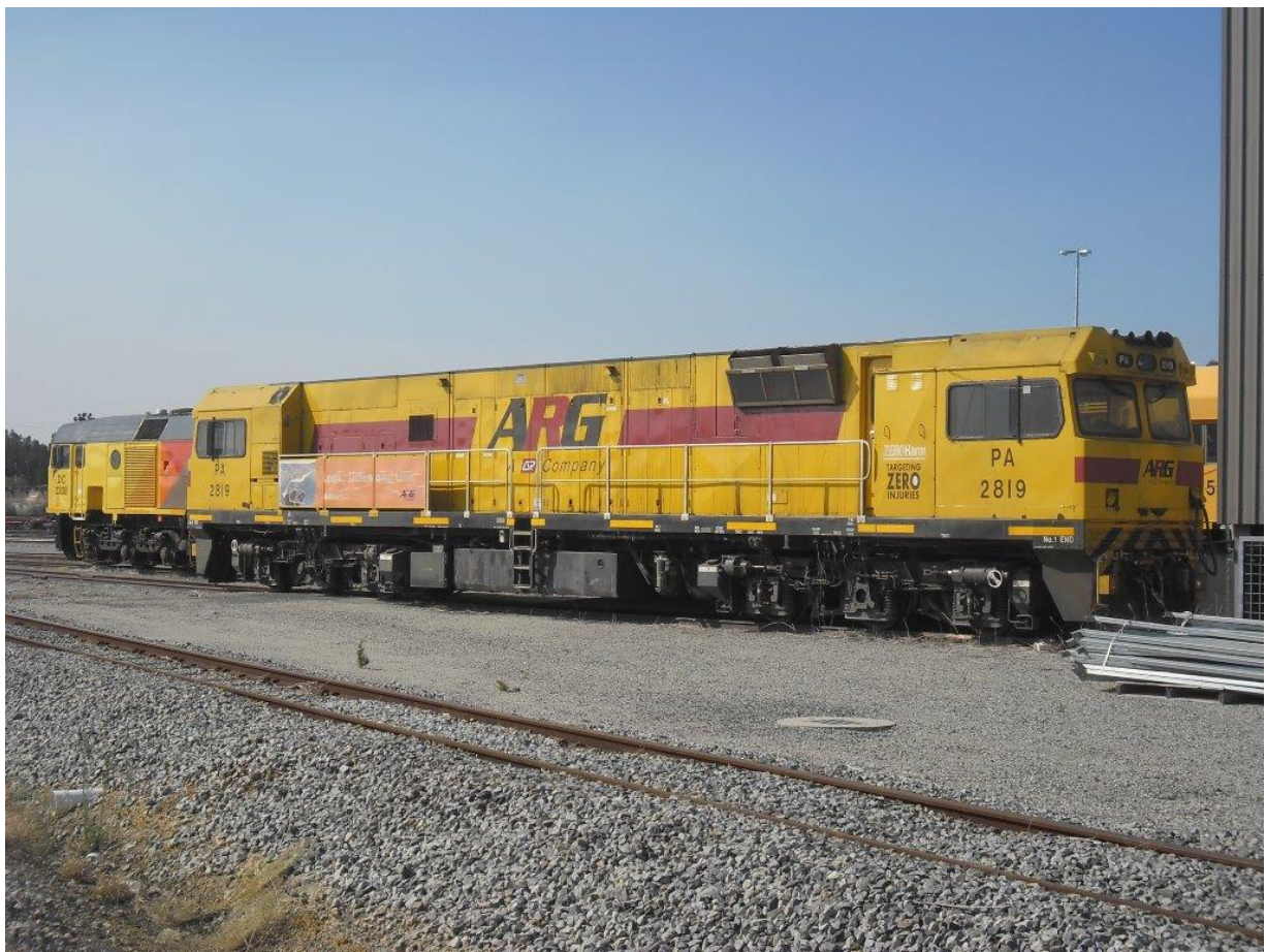
PA2819, DC2204, AB1504 at Forrestfield, 14 th May.