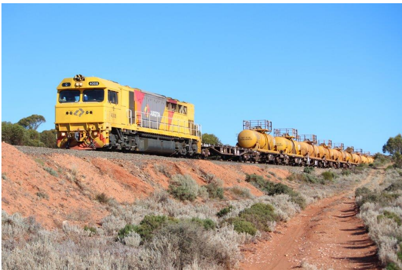
Q4008 works 7405 empty acid shuttle from West Kalgoorlie to Hampton past the 7km peg, 12 th May.