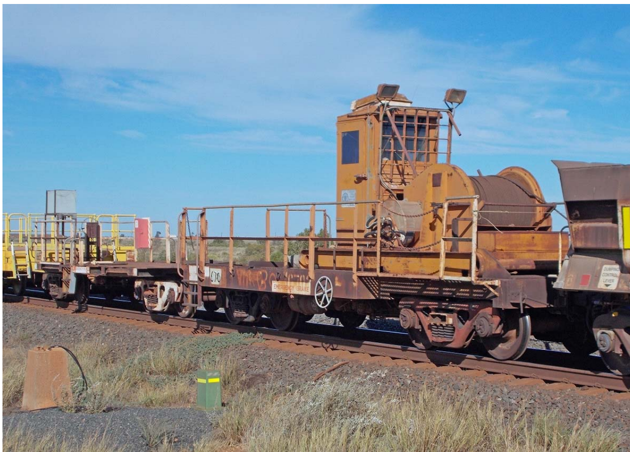
Obsolete cable car 670 and flat car 665 which used to carry an ATCO “donga” as a crib room for track workers, formerly used during duplication works – each is a former ore car chassis, 17/5.