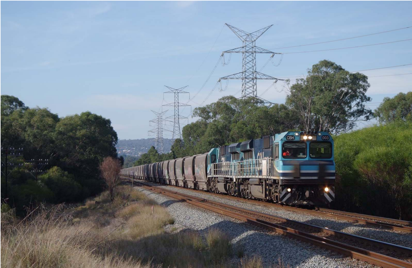
CBHs 003 & 007 with 2K55 grain train at Middle Swan, 14 th May.