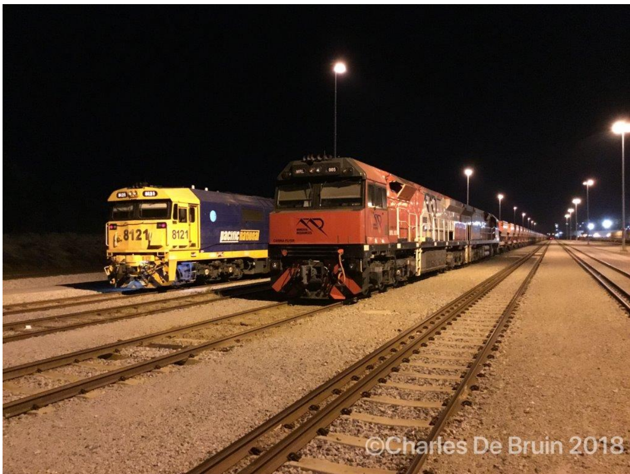
8121 on shunt duties beside a stored MRL train, Forrestfield Long Arrivals, 14 th May.