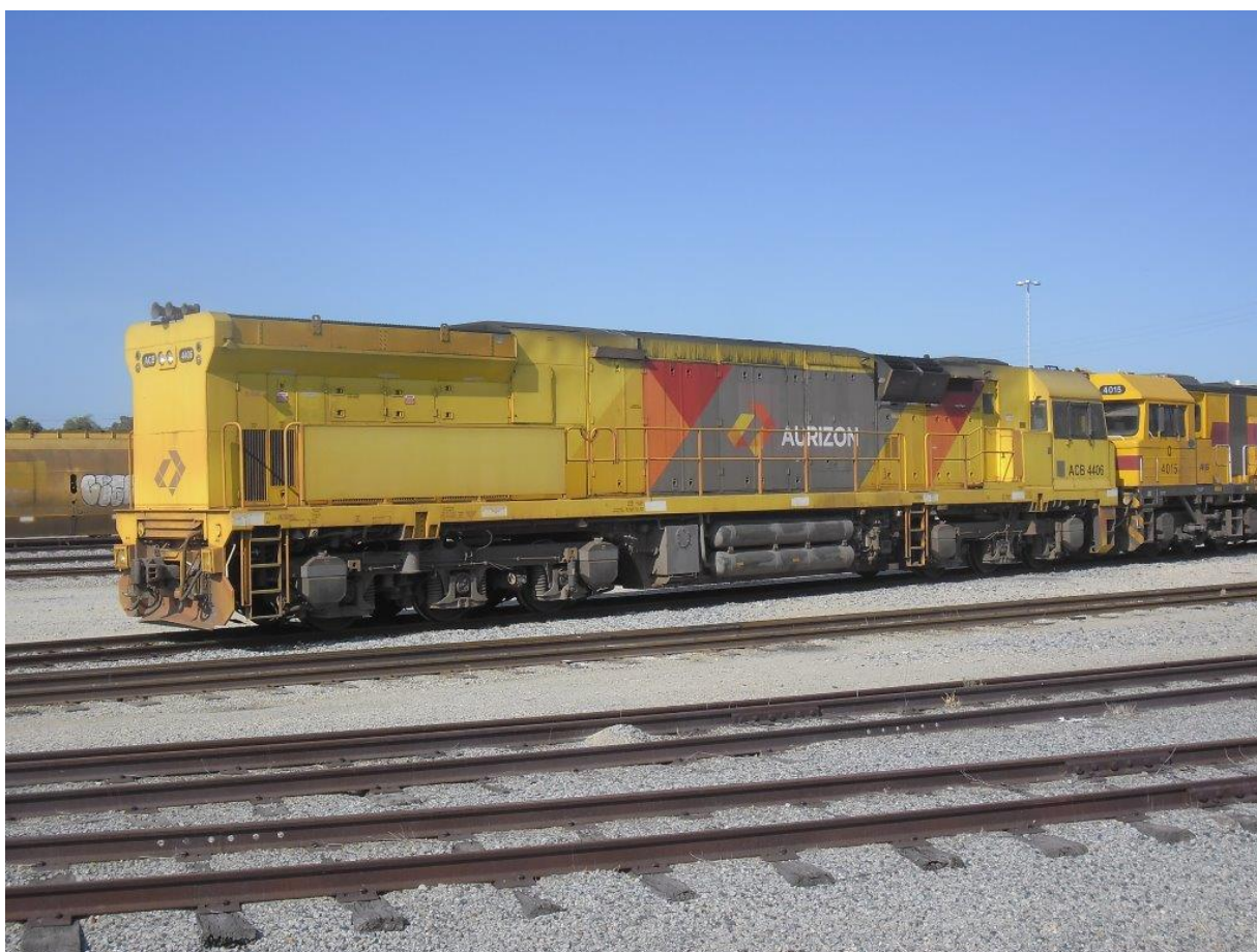
ACB4406 and Q4015, Forrestfield, 14 th May.