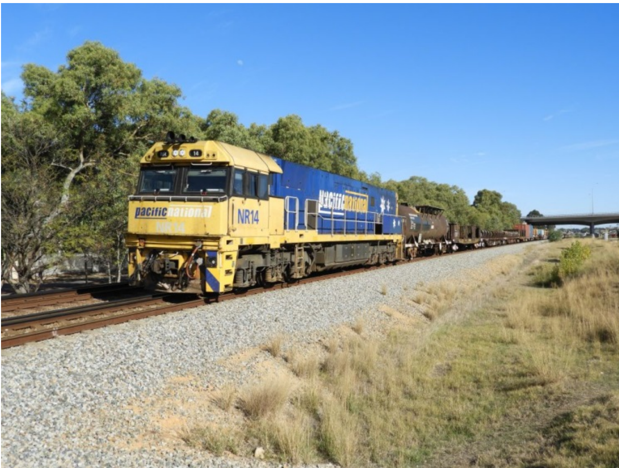
After several weeks on MRL ore trains, NR14 returned east on 7PX4, seen at Bellevue, 5 th May. Note the fuel tank wagon being returned to Kalgoorlie for the Esperance line fuel traffic following workshops attention.