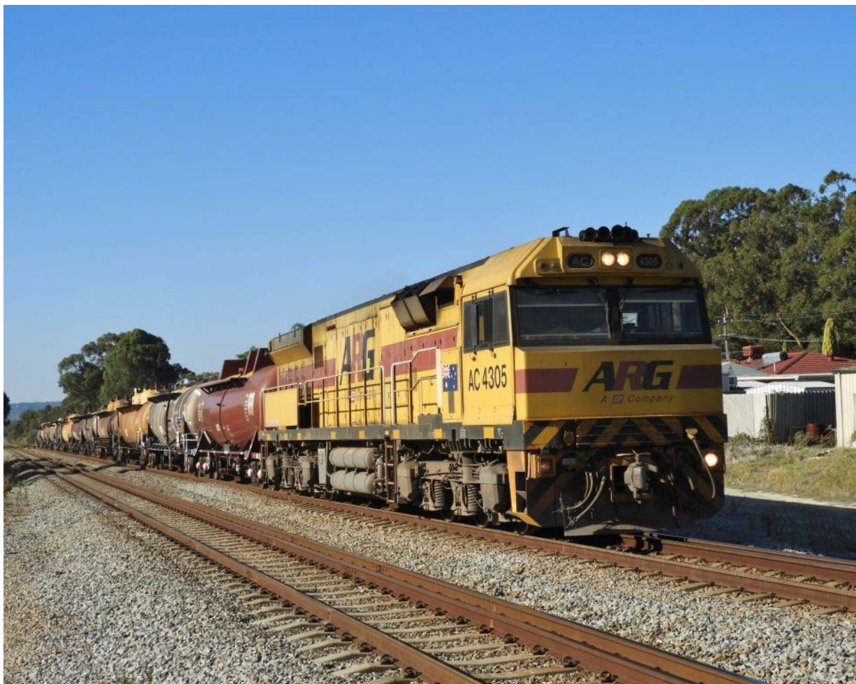
AC4305 works 3158 Forrestfield-Kwinana shunt with loaded fuel tanks from BP's terminal, May 8 th .