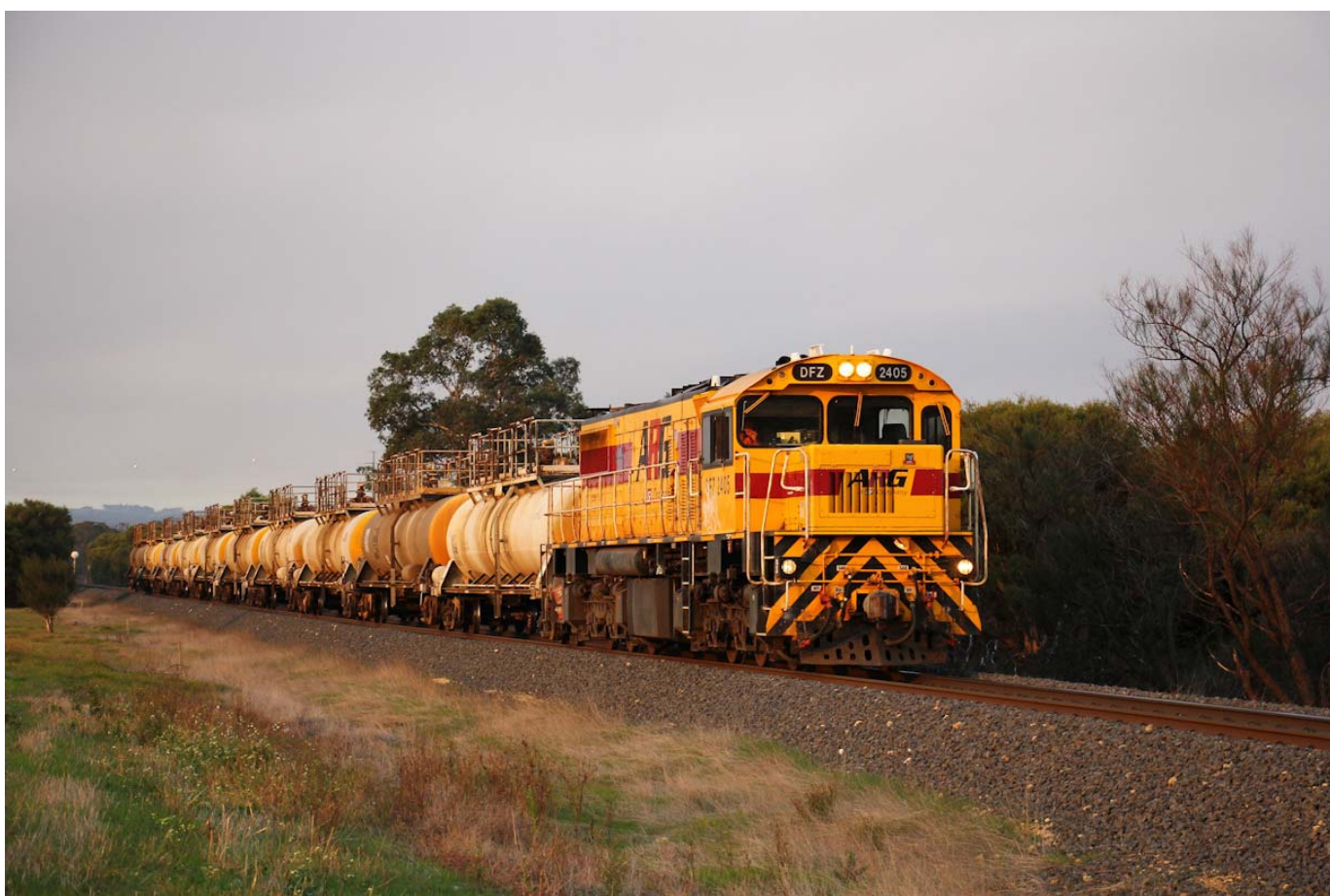
DFZ2405 heads an empty caustic train through Waterloo, 11 th May.