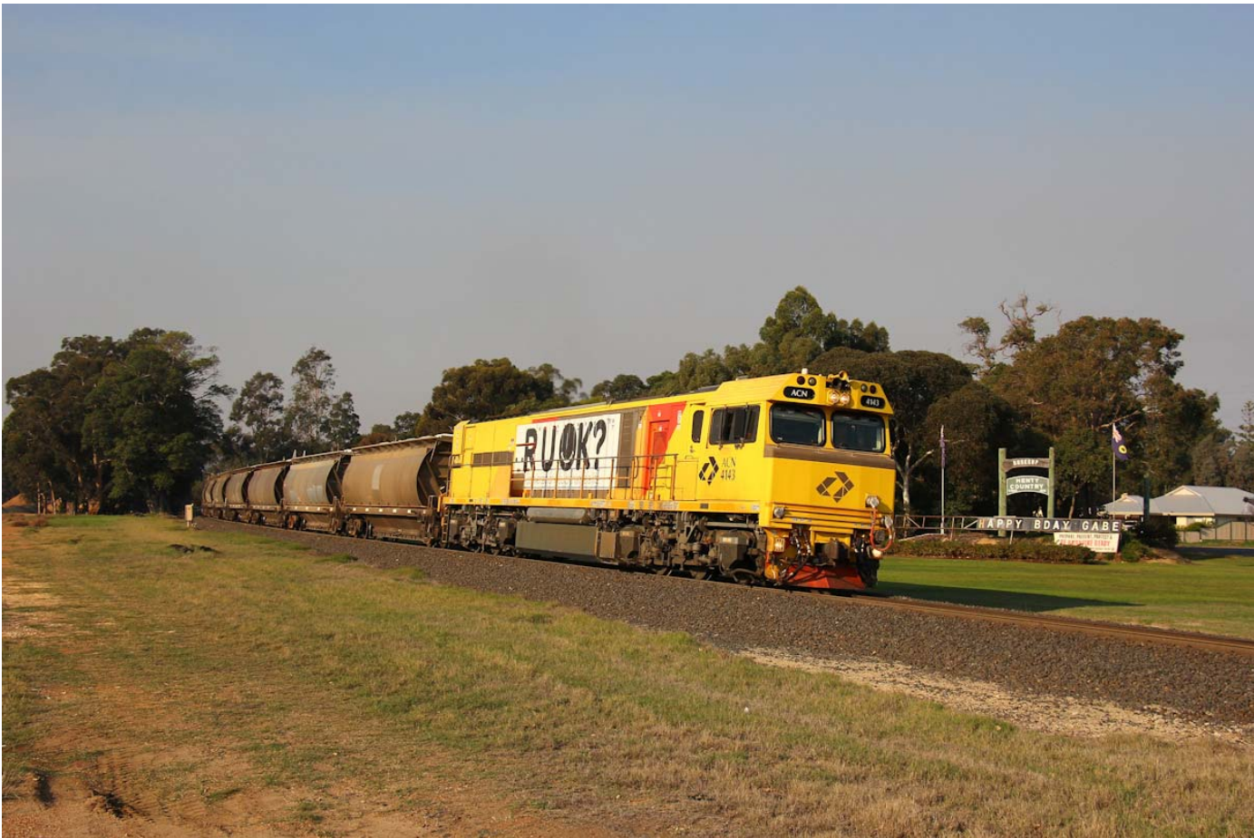
ACN4143 with its “RUOK?” mental health signage leads a load of alumina through Burekup to Bunbury Port, 11 th May.