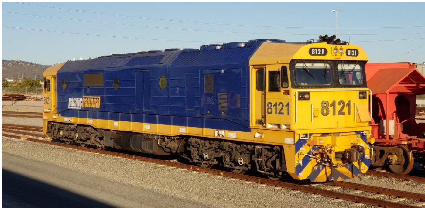
Shunt loco 8121 at Perth Freight Terminal, Kewdale, 18 th May.