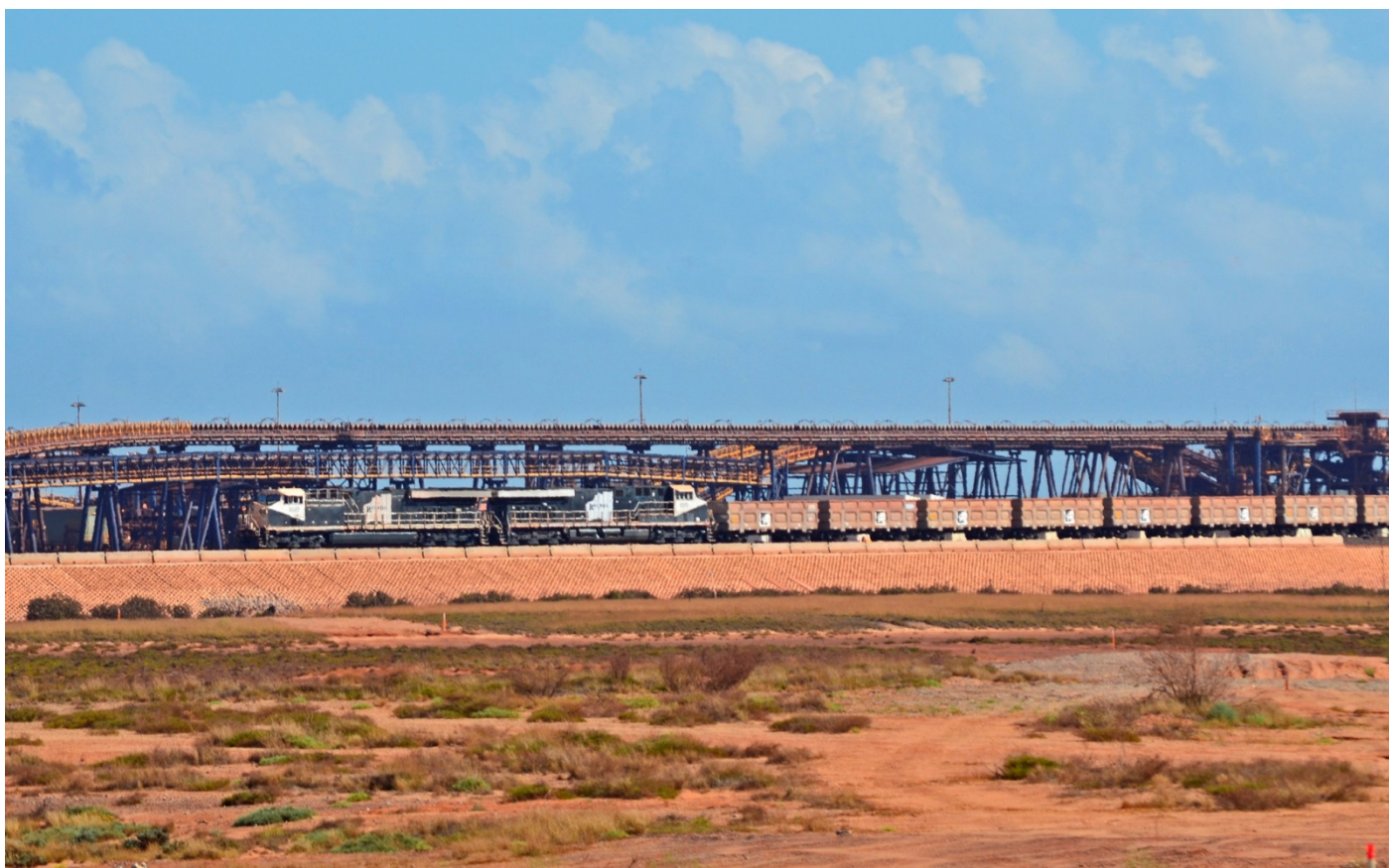
Roy Hill's RHA1010 and 1019 unloading an ore train on Finucane Island branch, 1 st May.