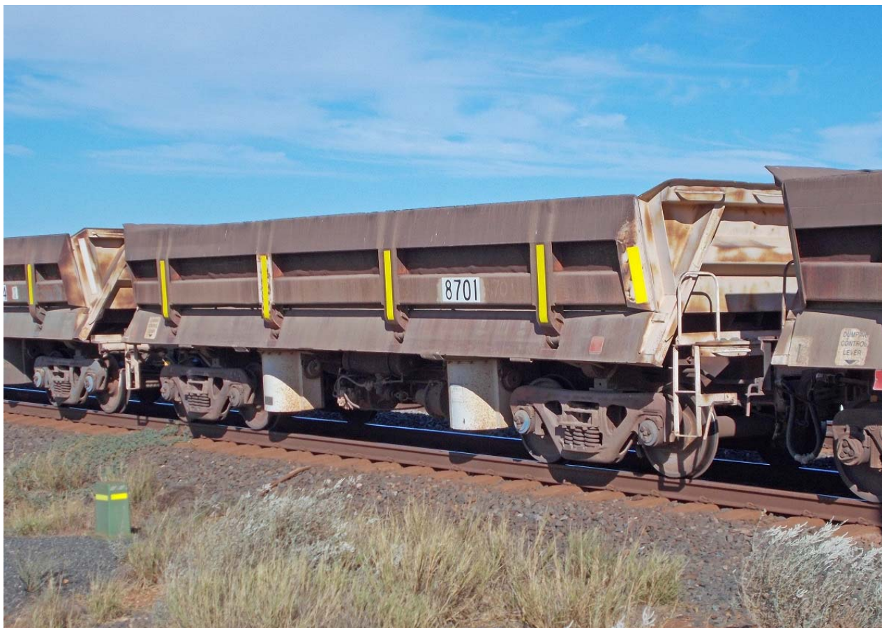
One of nine withdrawn side-tippers in the BHP obsolete wagon movement, 17 th May.