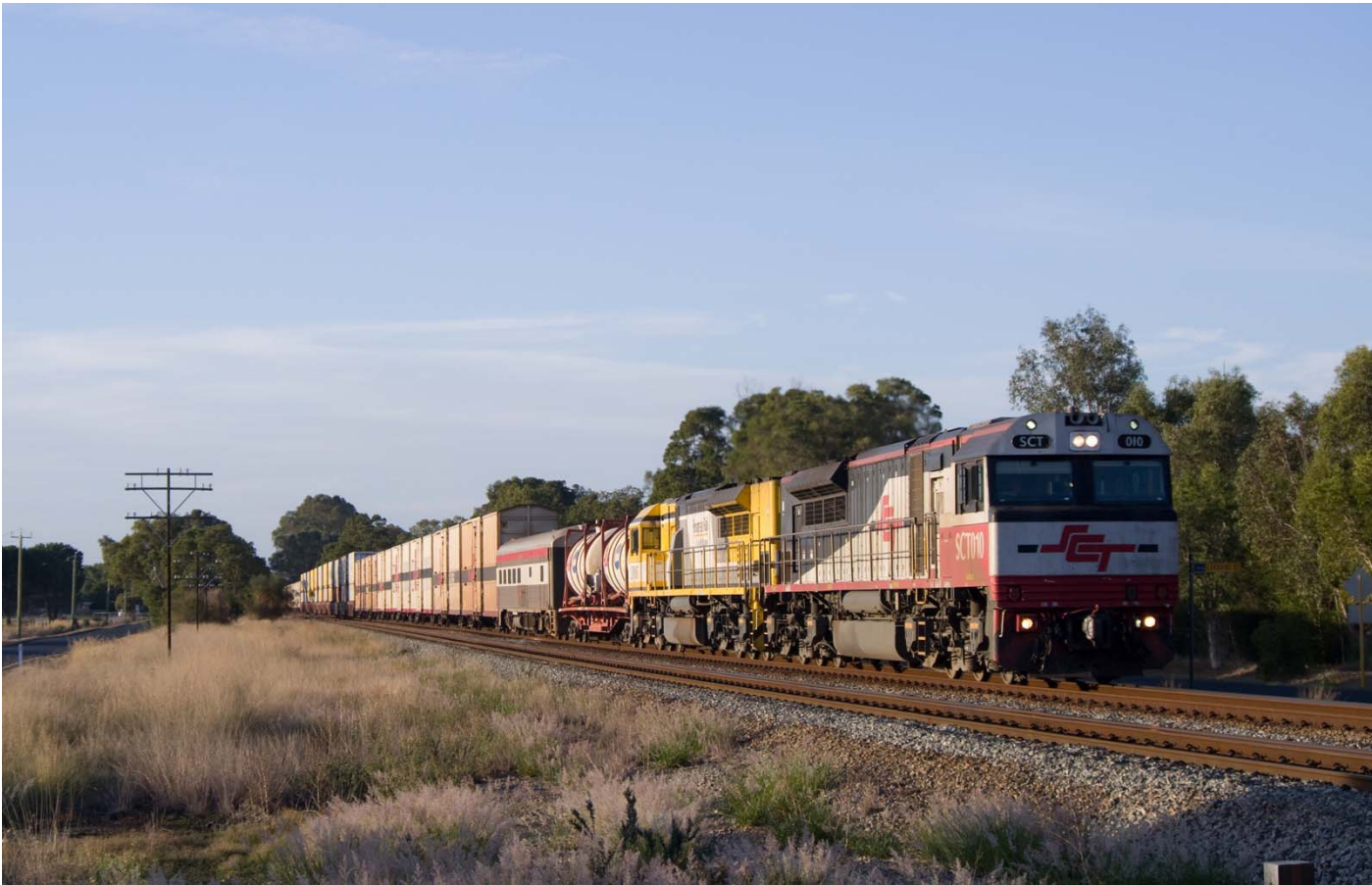
SCT010 & LDP005 on 6MP9, Herne Hill, 7 th May.