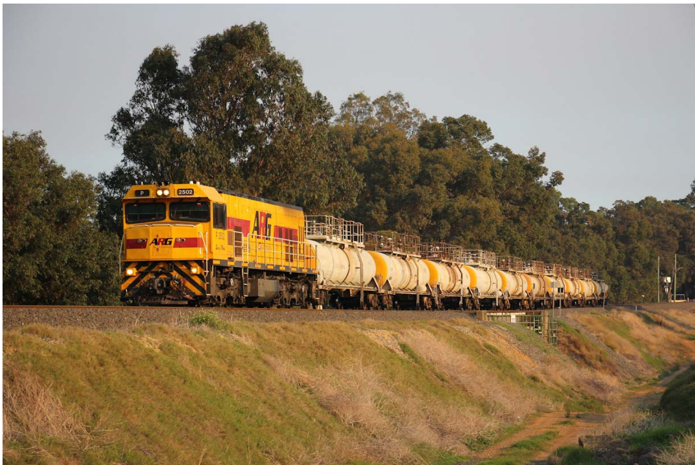
P2502 on a loaded caustic soda train at Roelands, 11 th May.