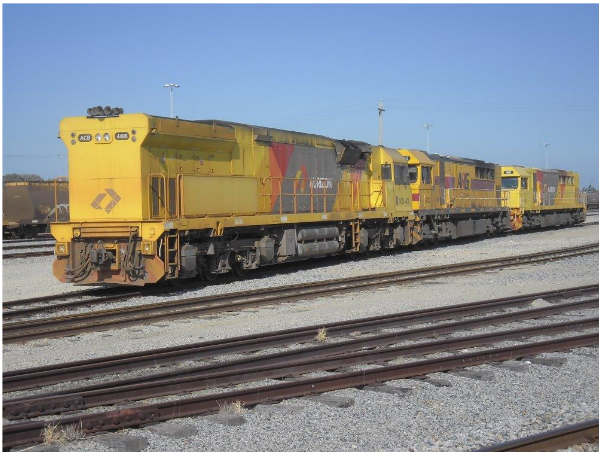
ACB4406, Q4015 & Q4002 at Forrestfield, 14 th May.