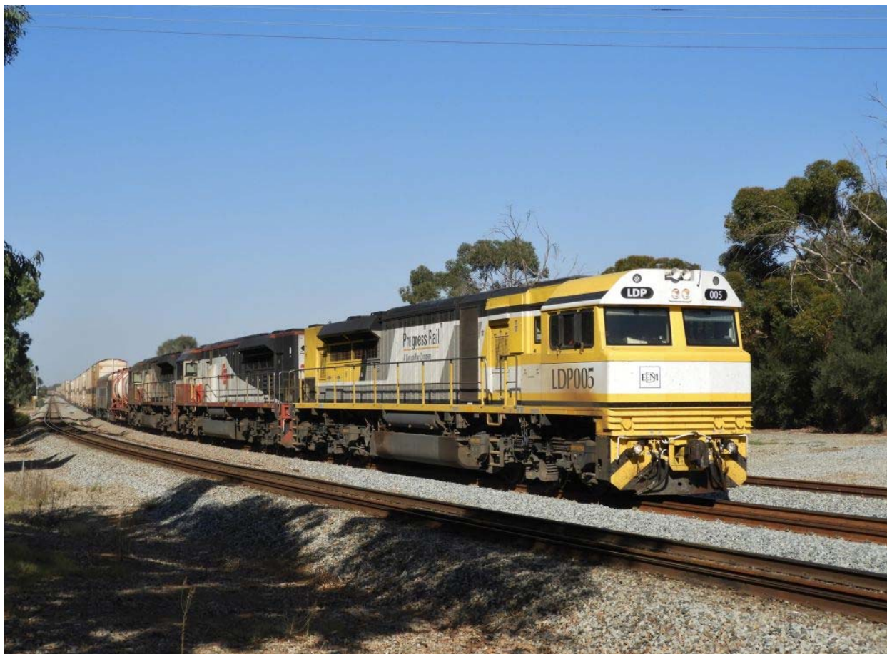
LDP005 leads SCTs 010 and 002 on a very late 2PM9, Woodbridge, 8 th May.