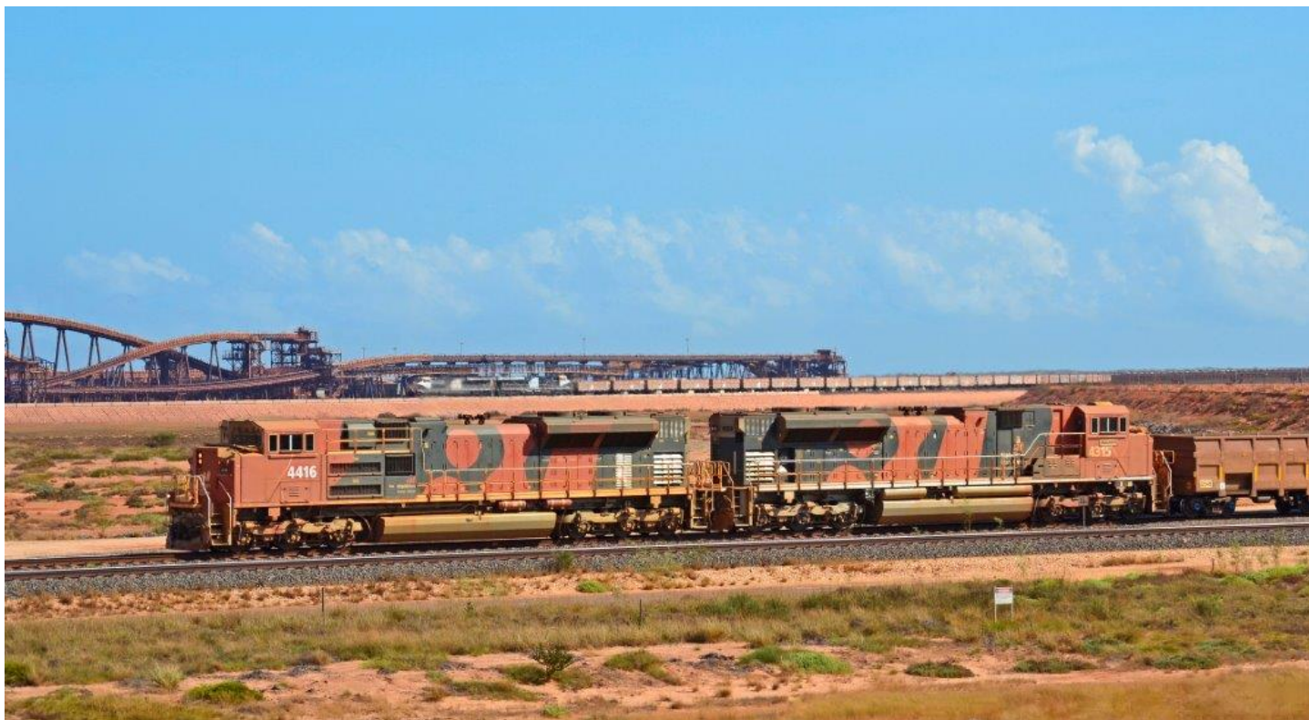
4416 & 4315 on an empty BHP hopper rake at Finucane Island, 1 st May.