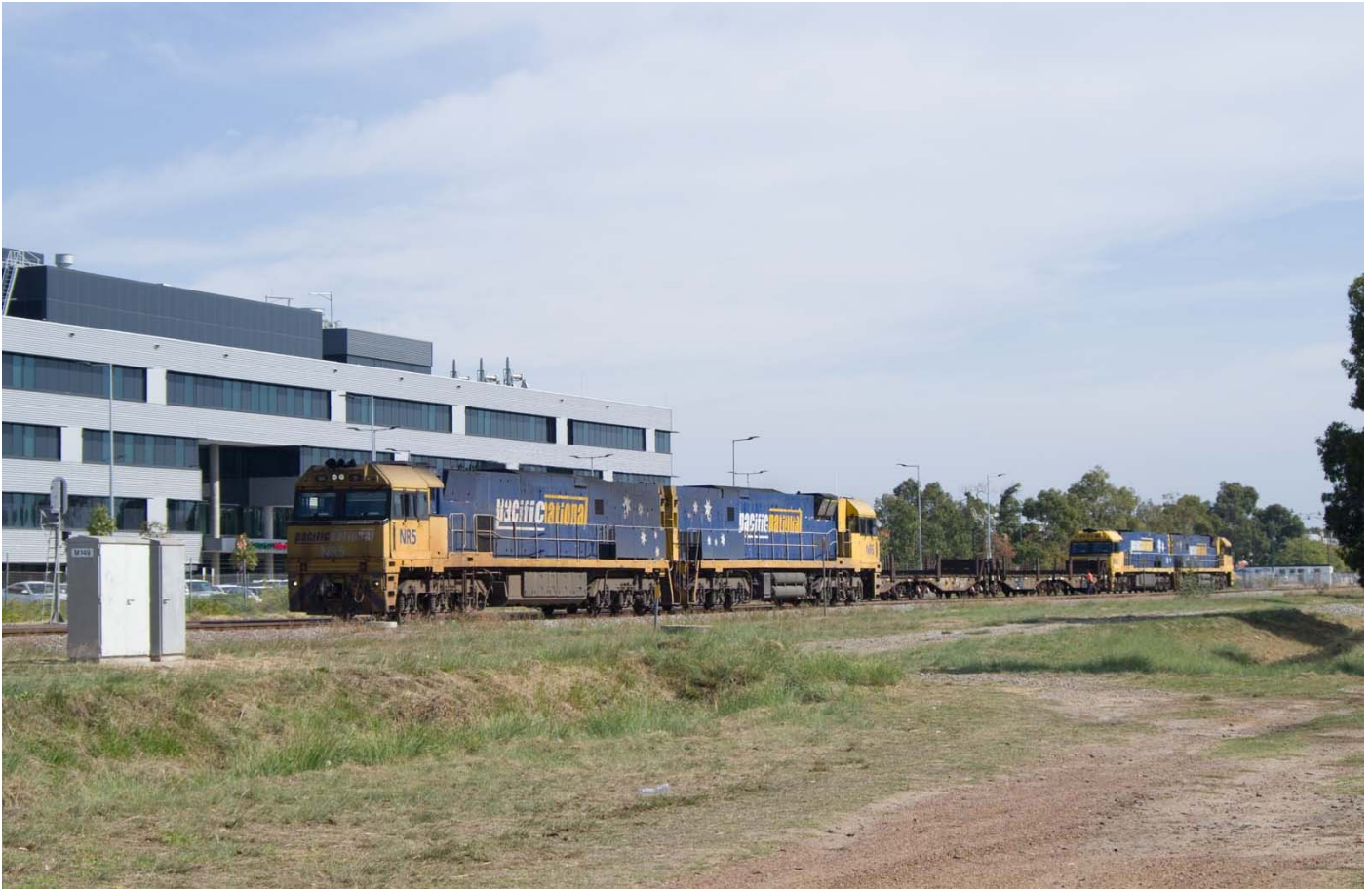
NRs 5 & 16 run 6P23 light engine past a pair of NRs on empty rail wagons at Midland, 4 th May.