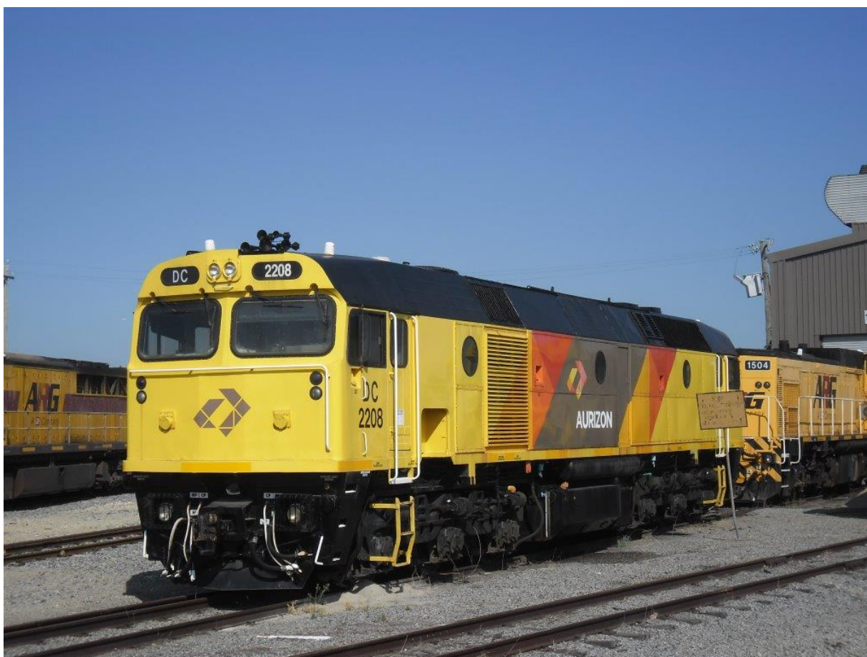
Long-stored DC2208 and AB1504, Forrestfield, 14 th May. Page 21 of 28