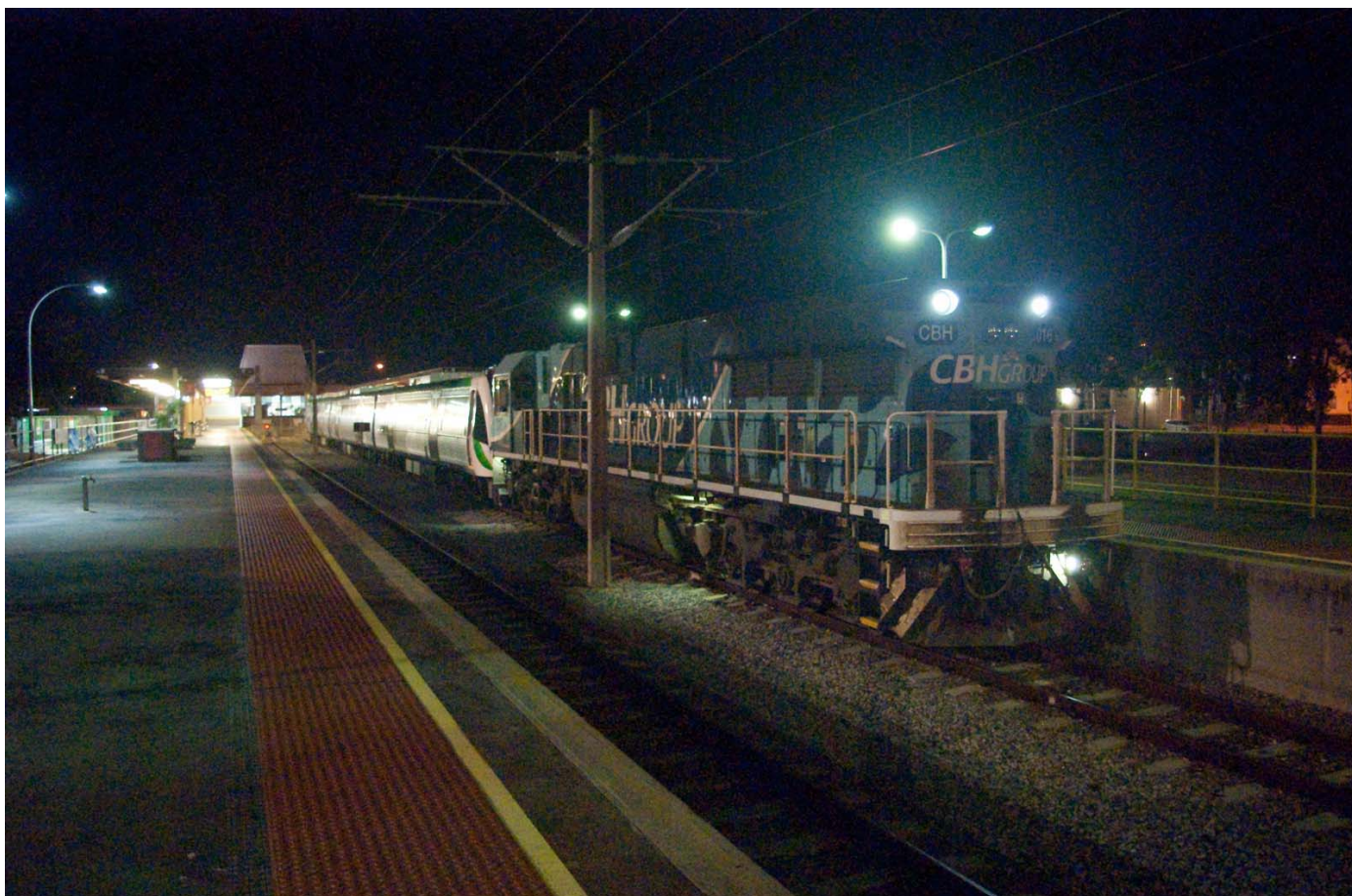
CBH016 at Midland with train 6WL2, consisting of the regauged TransPerth B set 118.