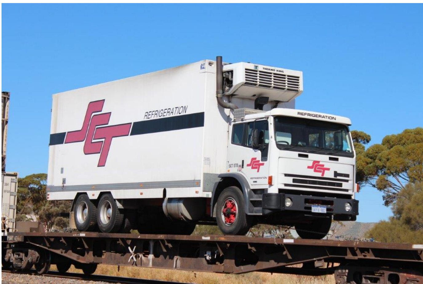
SCT070 refrigerated truck eastbound aboard 6PM9, 12 th May. Page 18 of 28