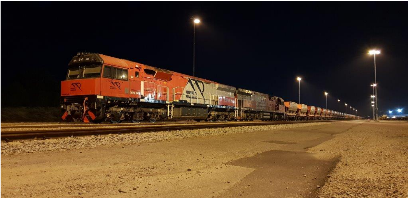
MRLs 005 and 003 stabled at Forrestfield on a stored ore rake, 13 th May.