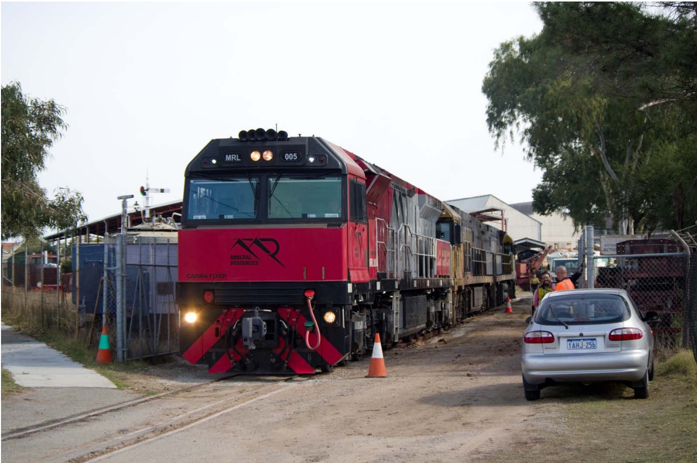
MRL005, NRs 5 & 16 on 6P24 at Bassendean, 4 th May. The MRL was being collected after work at UGL Rail. Page 8 of 28