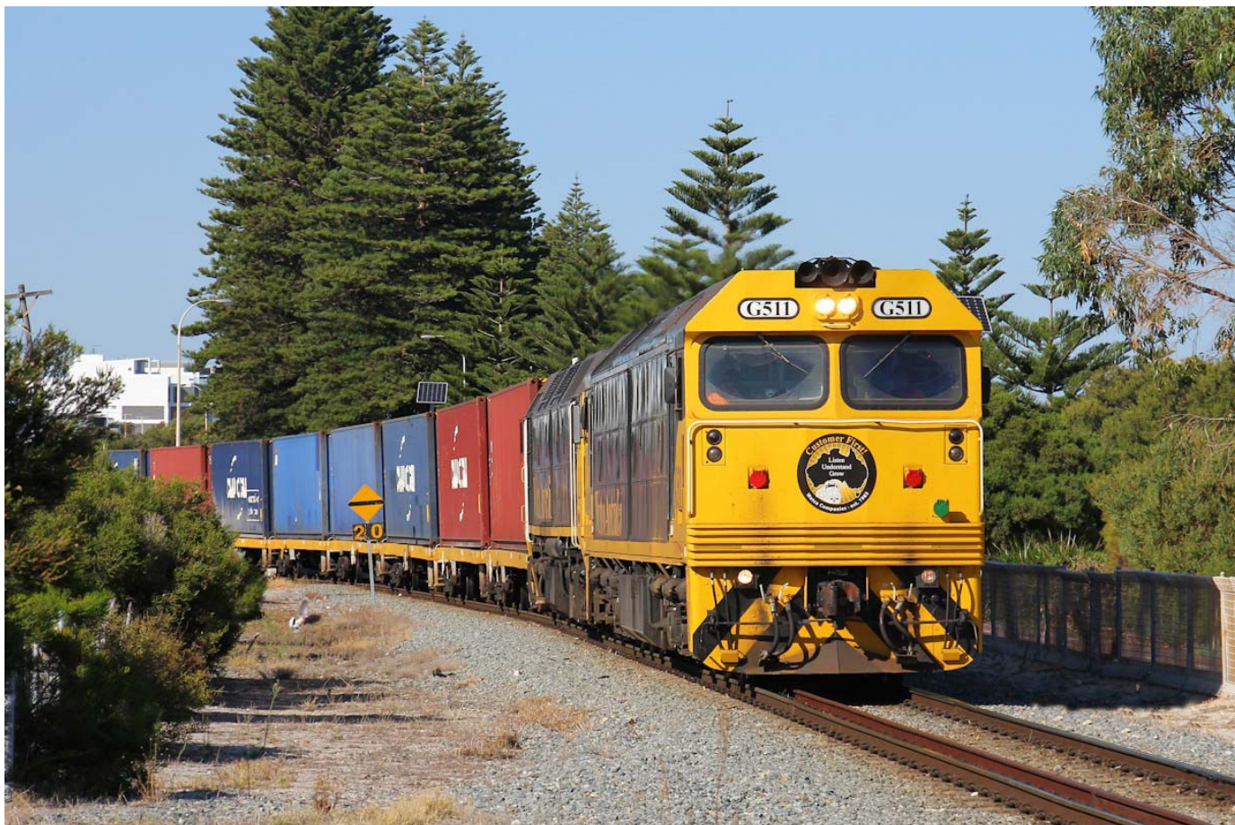
G511 & HL203 work 7142 container service through South Fremantle, 12 th May.