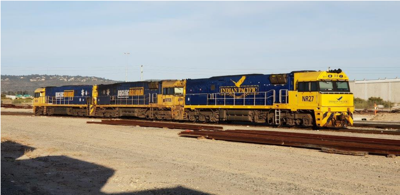
NRs 27, 108 and 38 stabled at Perth Freight Terminal, Kewdale, 7 th May.