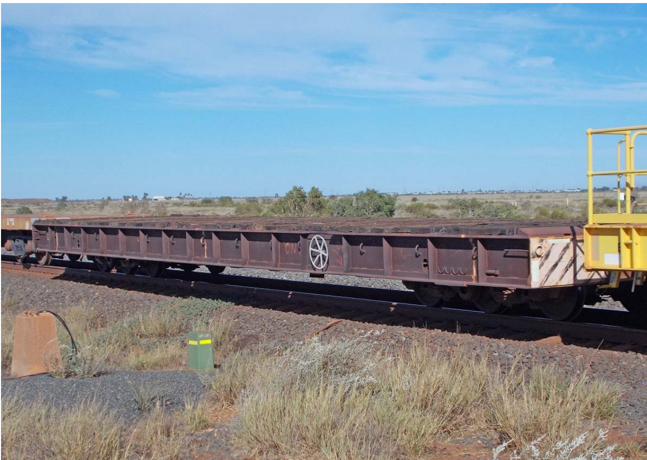
Old “Jumbo” car 6004 built by Vickers Hoskins in Perth in 1969 – note the 6-wheel bogies.