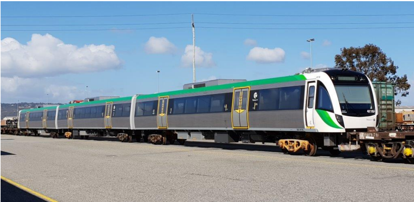
TransPerth B set 118 sits at Kewdale, 2 nd May, having arrived on SMP2 three days earlier.