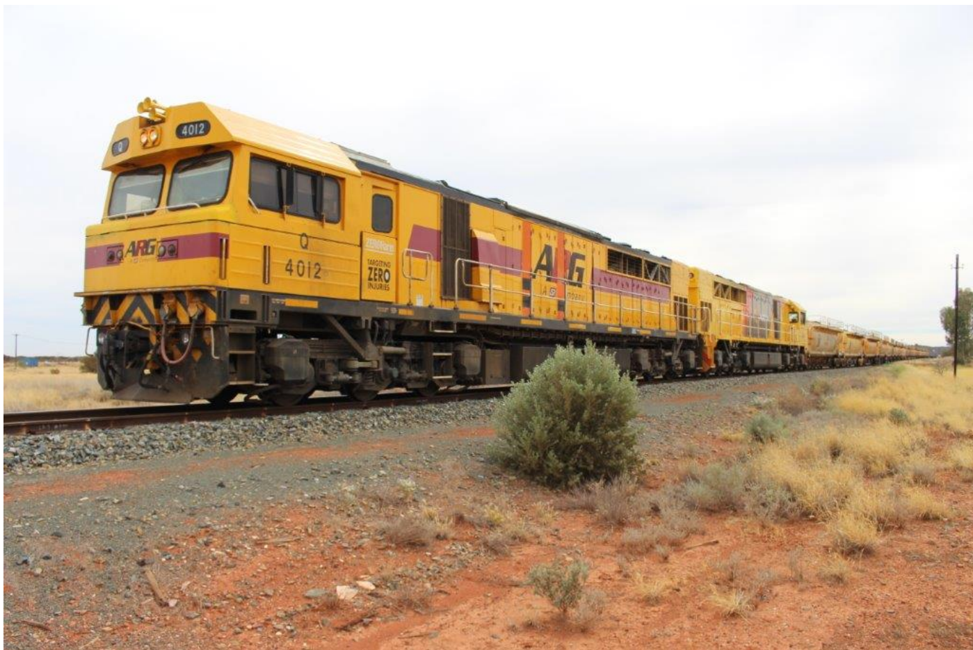
Qs 4012 & 4008 at Leonora on a rake of WNs containing BHP nickel concentrate and flat wagons with containers of Lynas rare earths, forming 3478 to Hampton (with the containers to be removed at West Kal), 1 st May