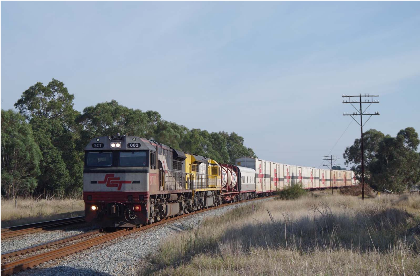
A very late 6MP9 passes through Middle Swan behind SCT002 & LDP005, 14 th May.