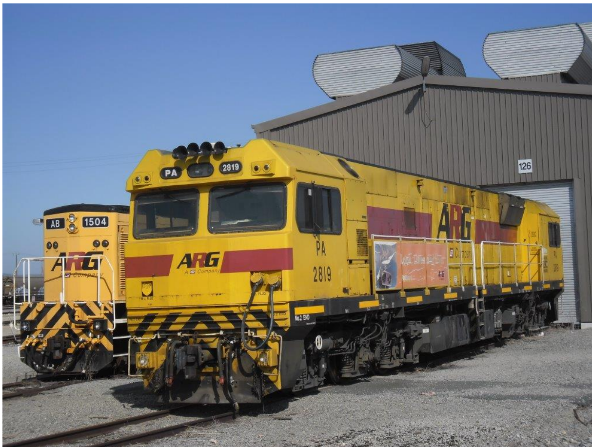
Much-travelled former Queensland 2800 class, PA2819 and AB1504, Forrestfield, 14 th May.