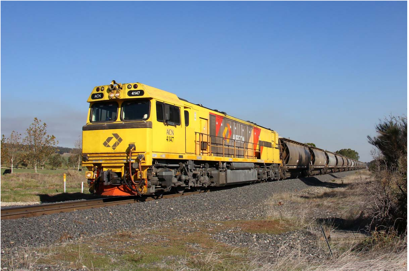
An empty alumina rake led by ACN4147 arrives at Brunswick Junction, 11 th May.