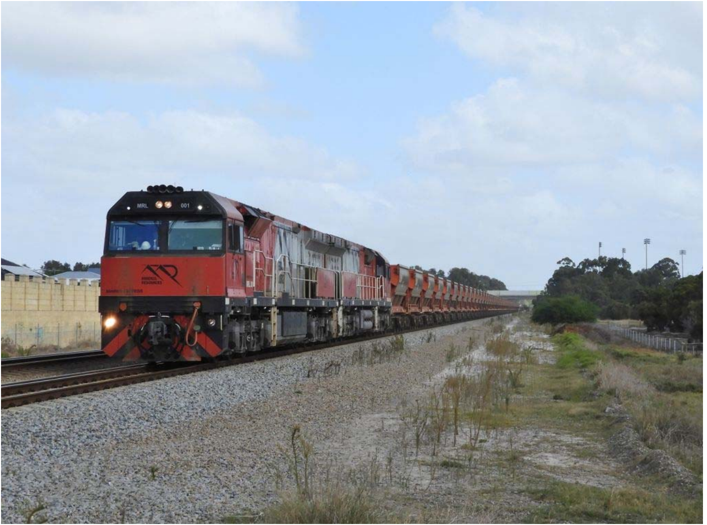
MRLs 001 and 004 on 4033, the second-last empty Polaris ore at Thornlie, en route to storage, 2 nd May.