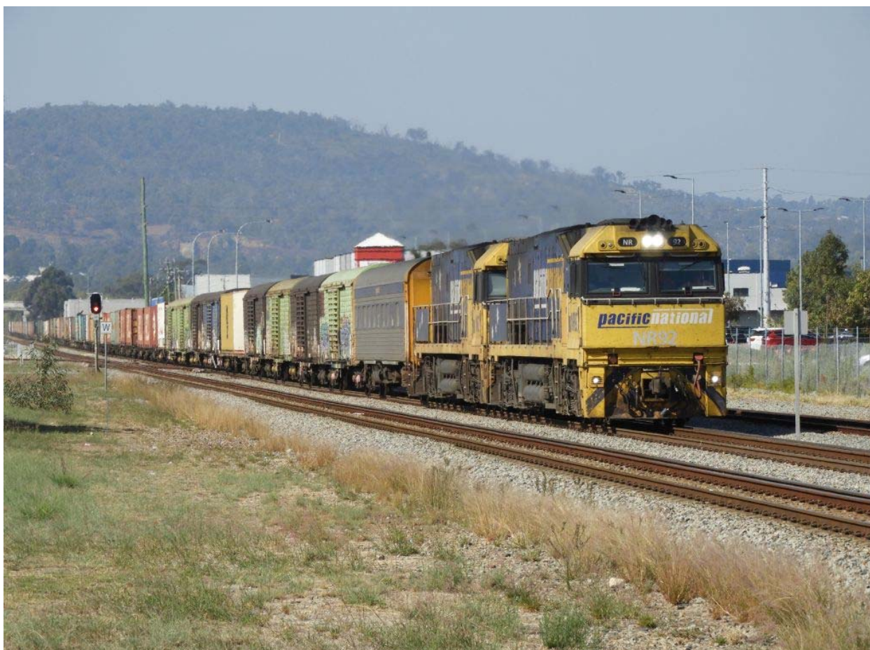
A late 7SP5 passes through Midland behind NRs 92 and 2 in rare (for PN) “elephants” formation, 8 th May. Page 12 of 28