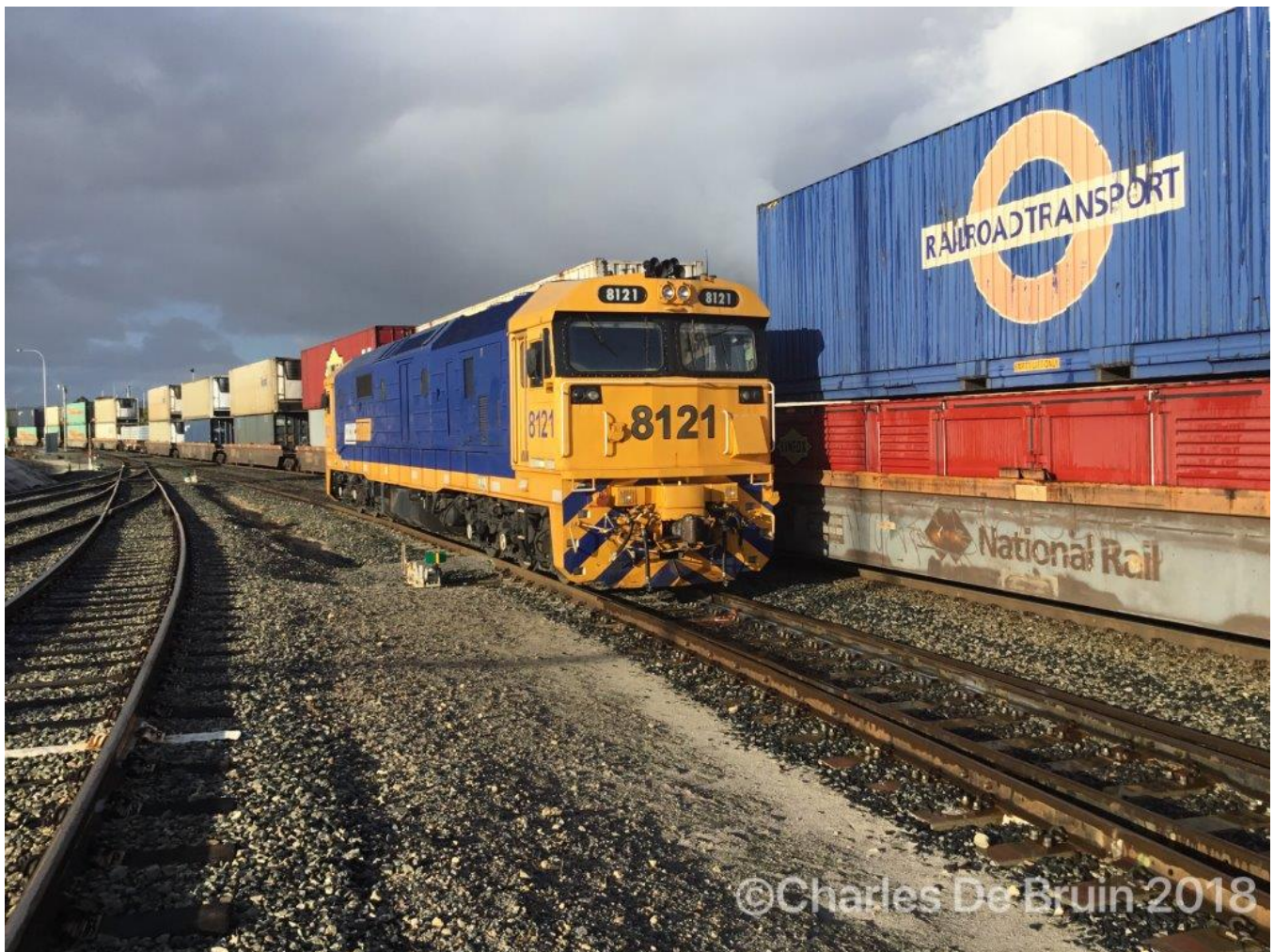
8121 on shunt duties, Perth Freight Terminal, Kewdale, 27 th May.