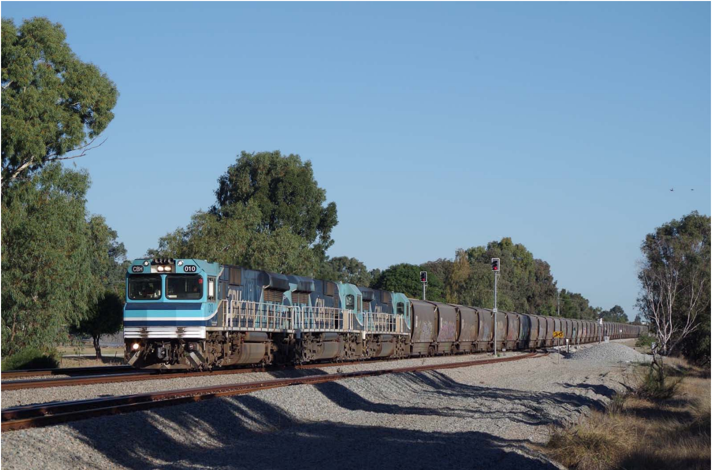
CBHs 010, 023 & 001 bring 1K07 through Woodbridge Junction, 20 th May.