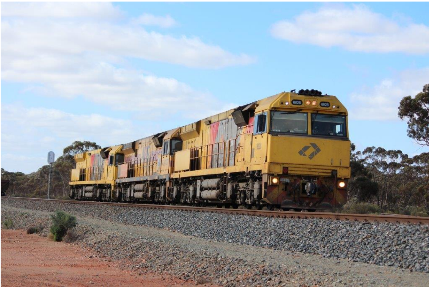
6028 and AC4307 prepare to cut 6021 off, Binduli, 27 th May.