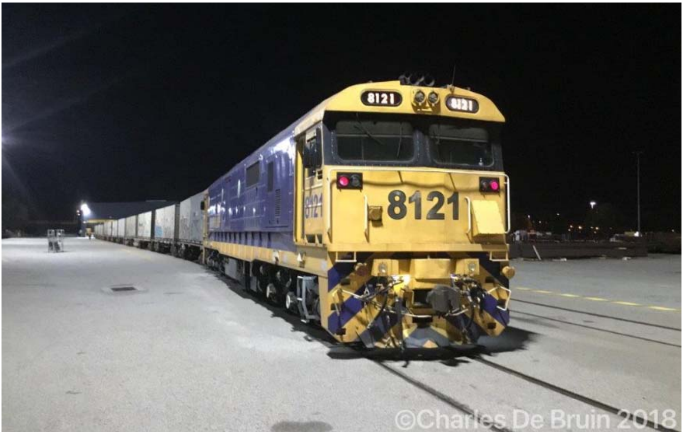
8121 shunting the Blue Scope steel sidings.