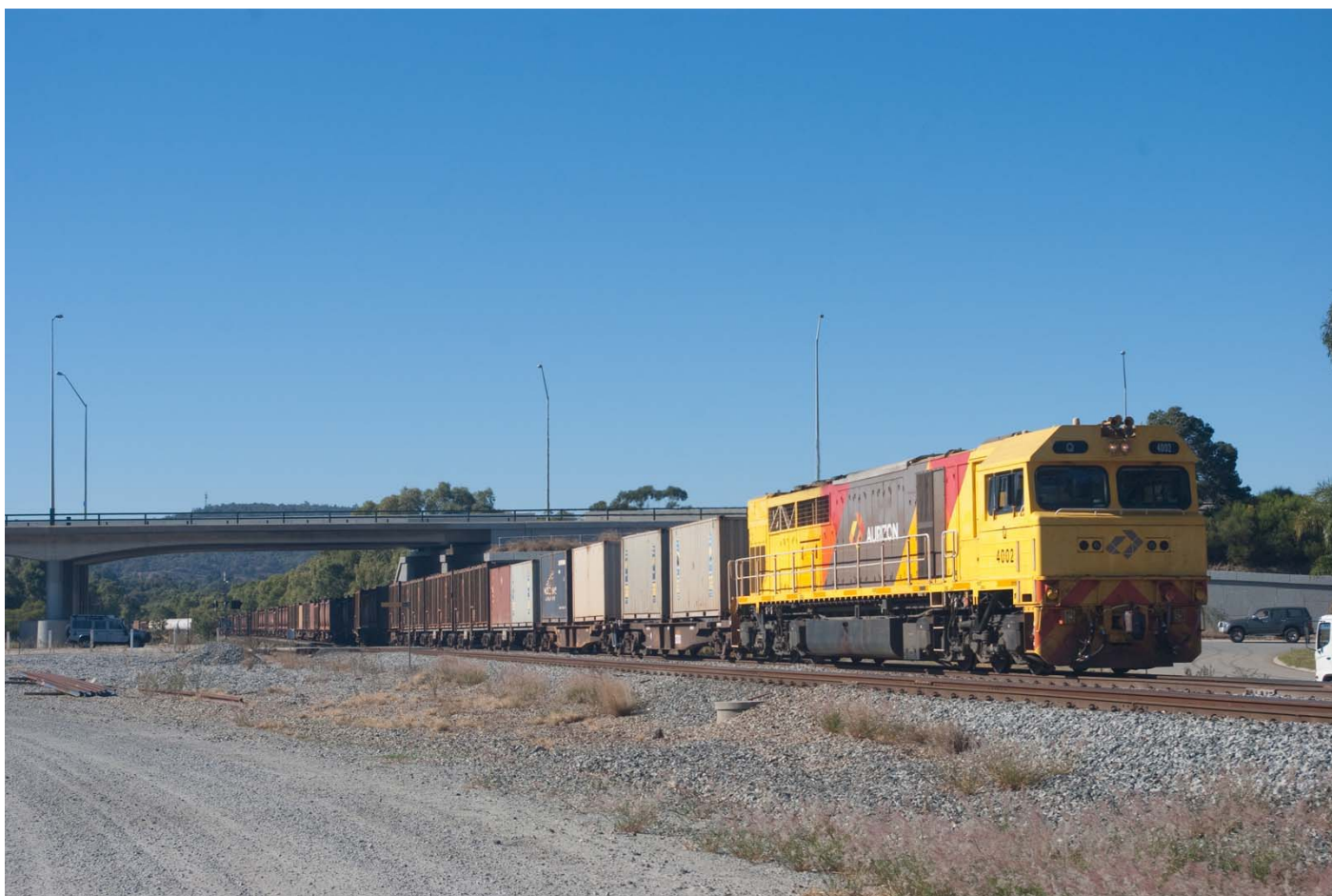
Q4002 leads 7430 empty sulphur from Malcolm through Bellevue, 20 th May.