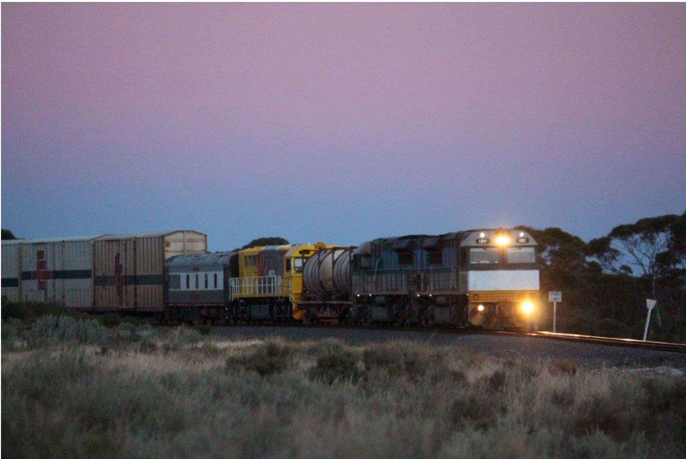
A late 2MP5 approaches Golden Ridge at sunset, 30 th May. LDPs 002 & 003 are hauling Q4006 back to Perth from overhaul and repaint at Progress Rail's Port Augusta workshops.