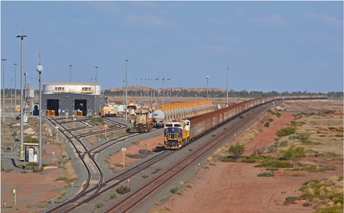
Fortescue Metal's Kanyiri yard – 709 & 711 wait to enter with a loaded iron ore, while 005 sits in the yard with the fuel wagons.