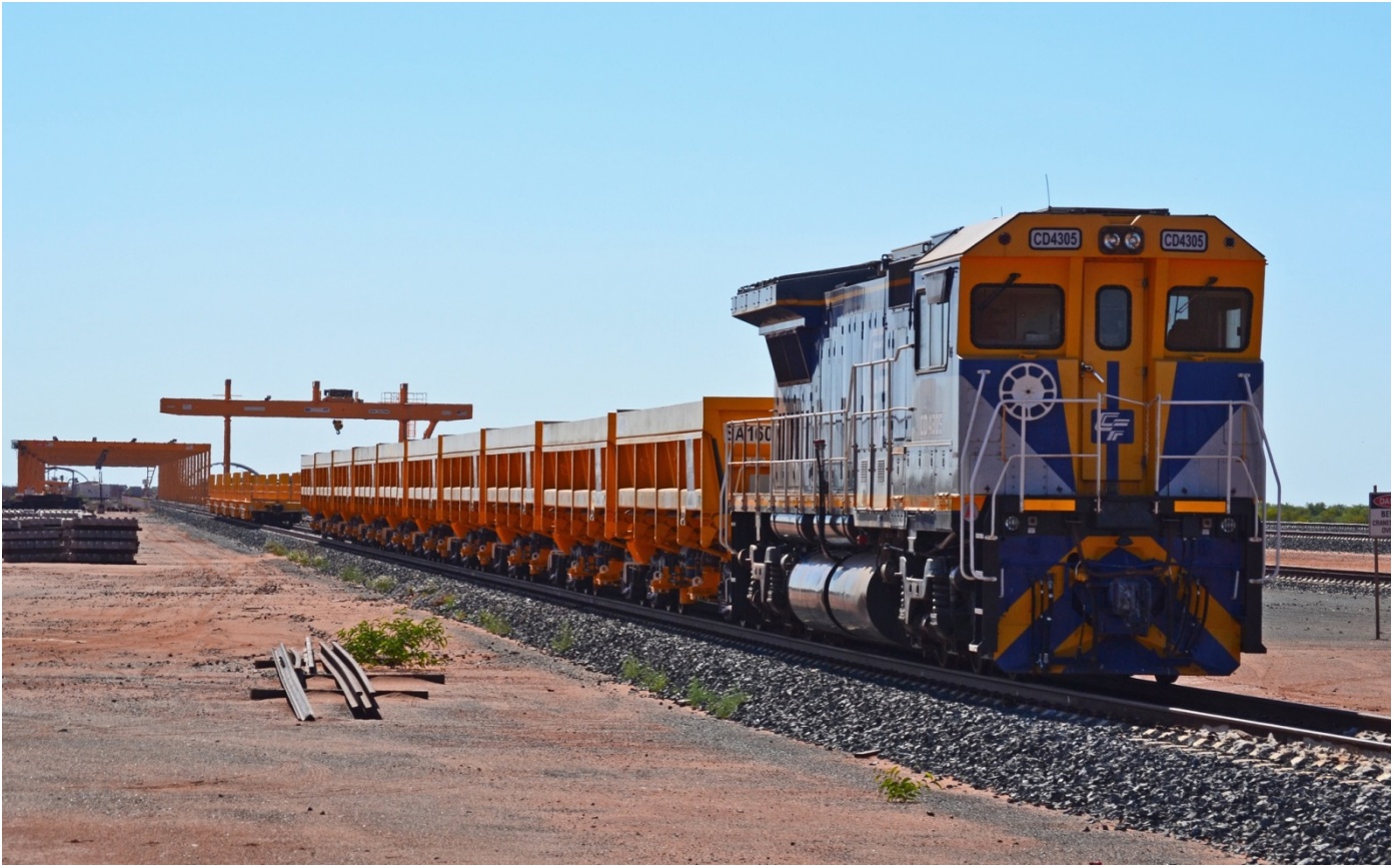
Leased CFCLA unit CD4305 on a rake of Roy Hill side tippers, Rail Construction Yard, 31 st May.