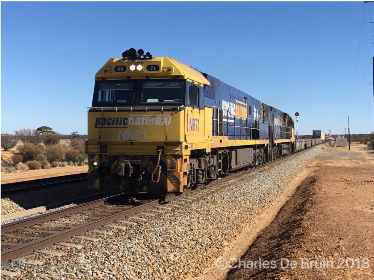
NR71 at Booran on 1PS6.