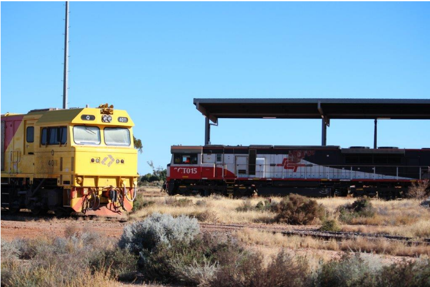
SCT015 with burnt hood panels passes stabled Q4011, Parkeston, 19 th May.