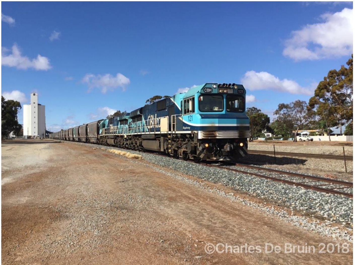
CBHs 118 & 121 shunt Tammin CBH.