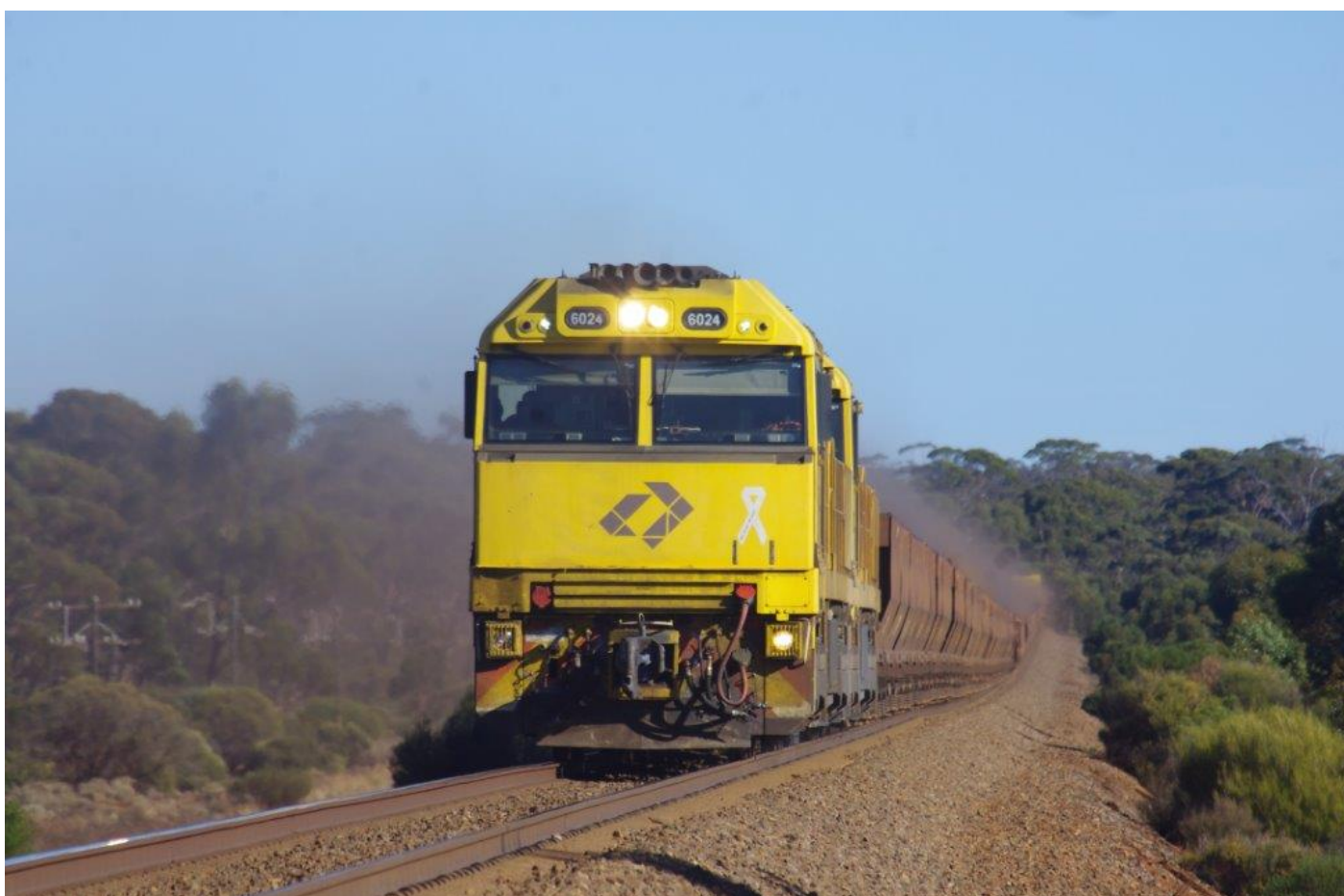
Iron ore dust flies as 6024 & ACC6032 (DPU ACB4405 & 6026) race 14,200 tonne 4413 loaded ore through Beckwith, 30 th May.