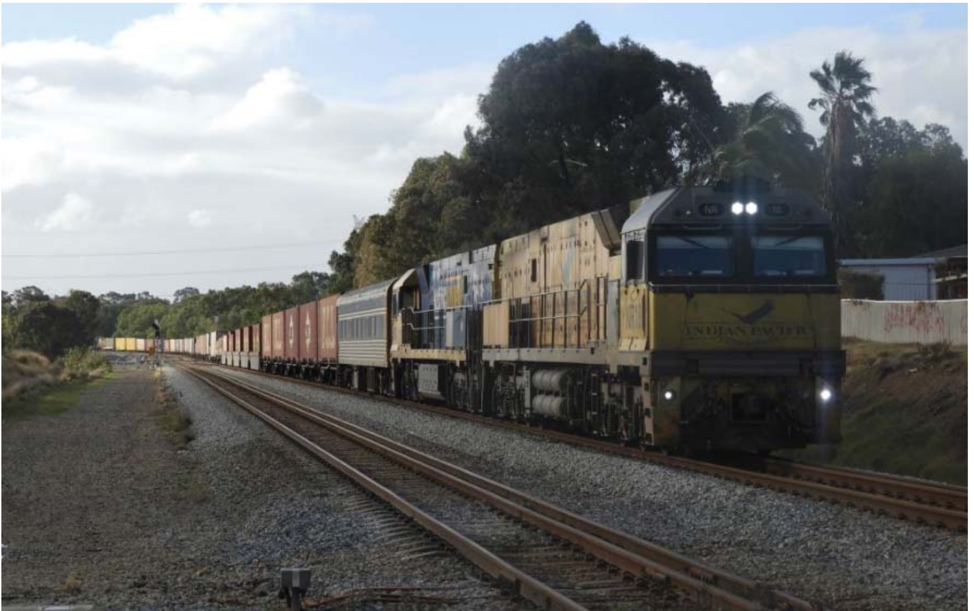
NRs 18 & 30 haul 6SP5 through Hazelmere, 27 th May.