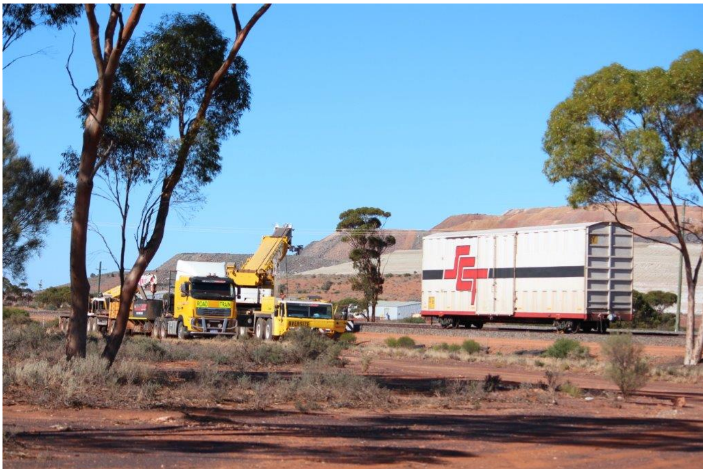
Cranes prepare to lift the end of PBHY122 to swap the defective axle/bearing wheelset, 20 th May.