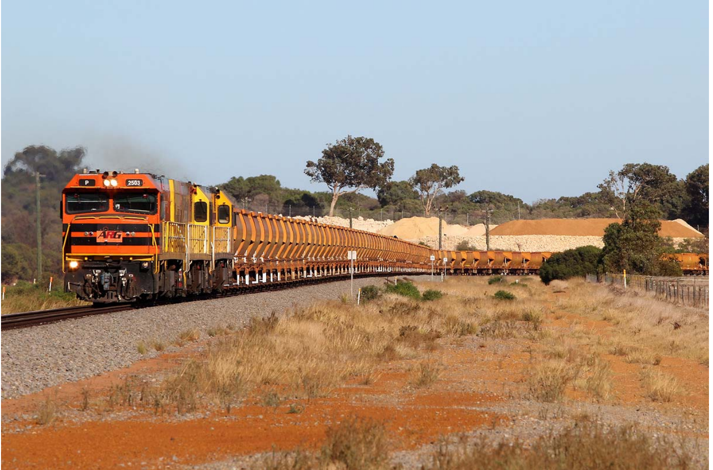
7720 empty ore passes through Narngulu behind Ps 2503, 2505 & 2508, 19 th May.