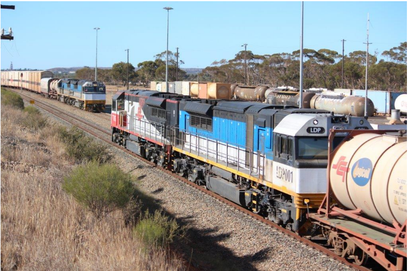
SCT015 & LDP001 on 6PM9 wait to cross LDPs 002 & 003 on 5MP9, West Kalgoorlie, 19 th May.