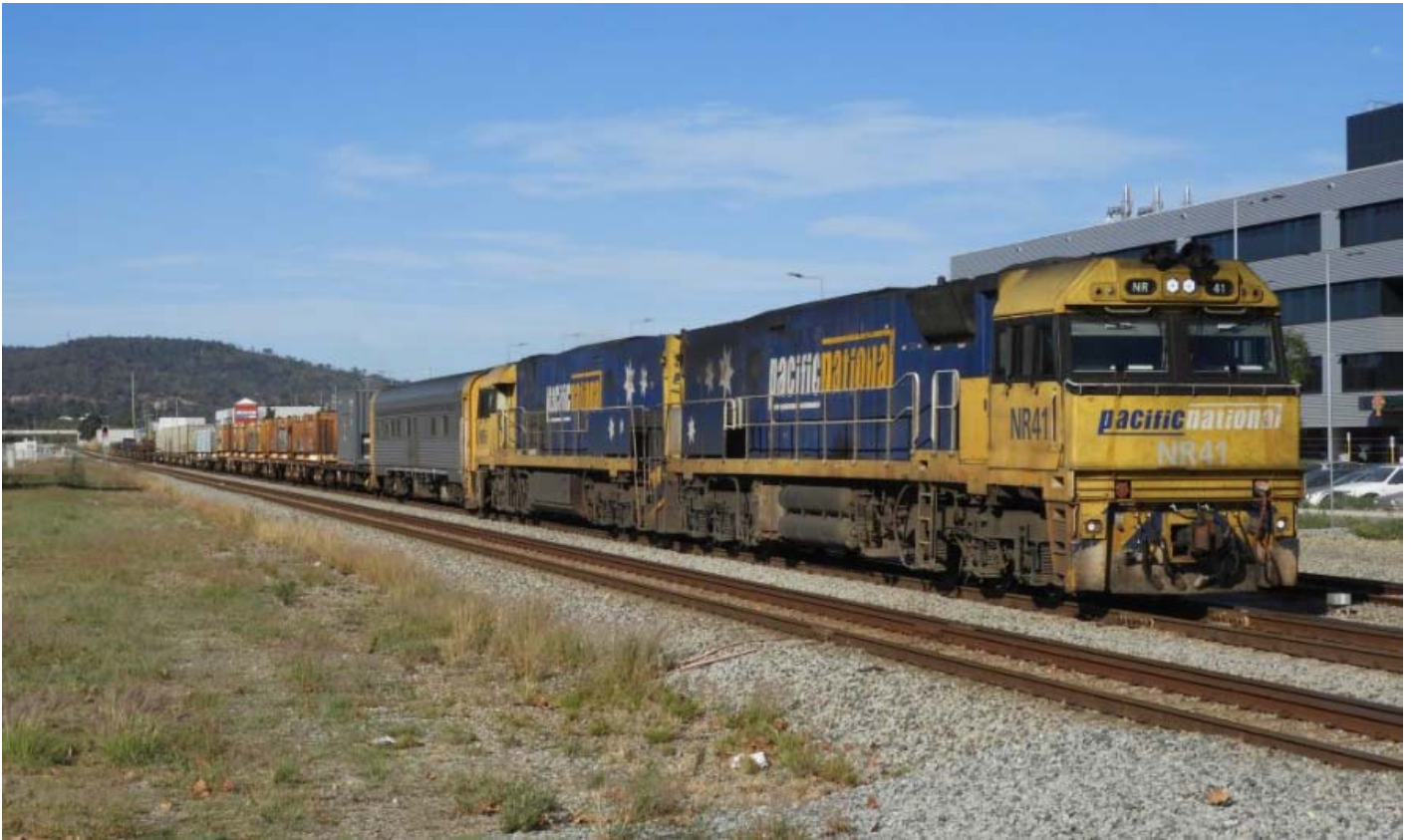
NRs 41 & 69 lead 1MP2 steel train through Midland, 30 th May.