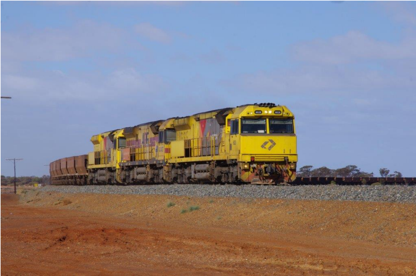
6023, AC4307 & 3021 lead 1414 empty ore through Kambalda, 27 th May.