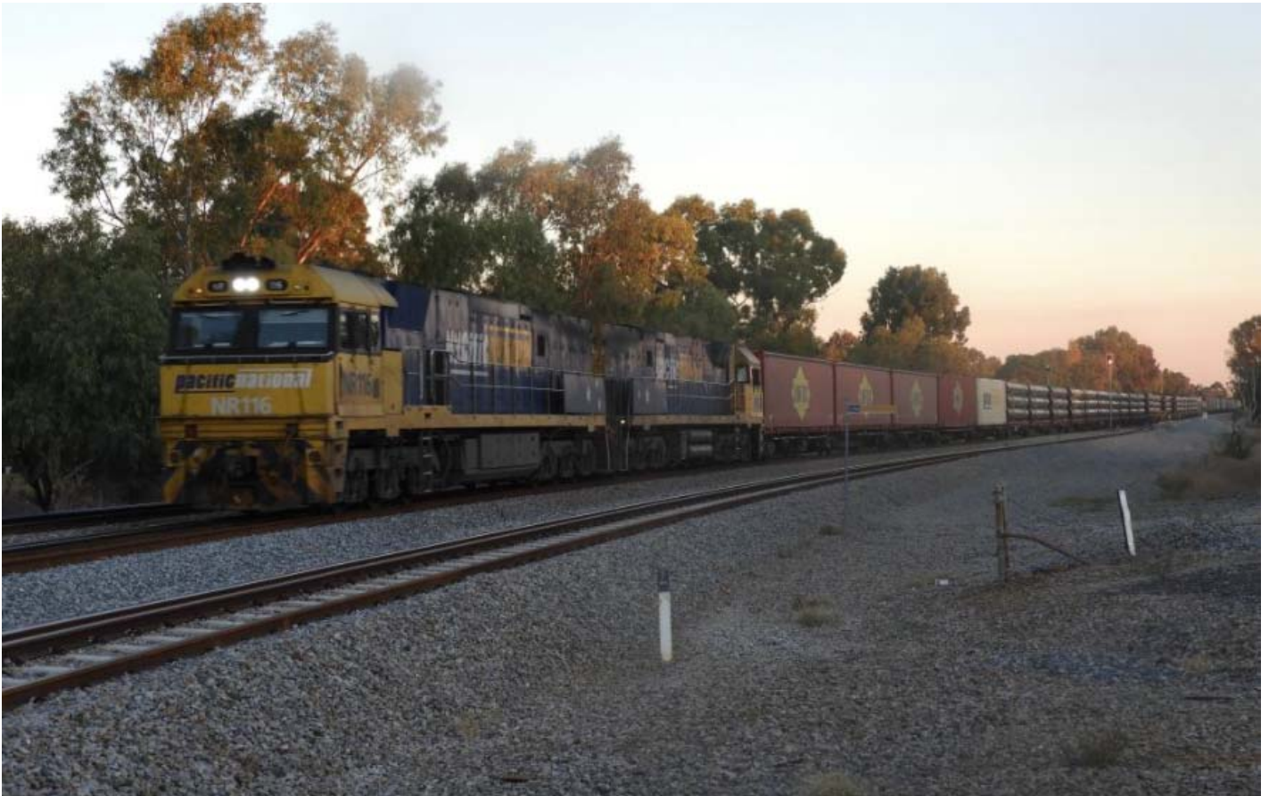
Another 19 flattracks of water pipes for Broken Hill aboard 2PS7 (NRs 116 & 4), 21 st May.