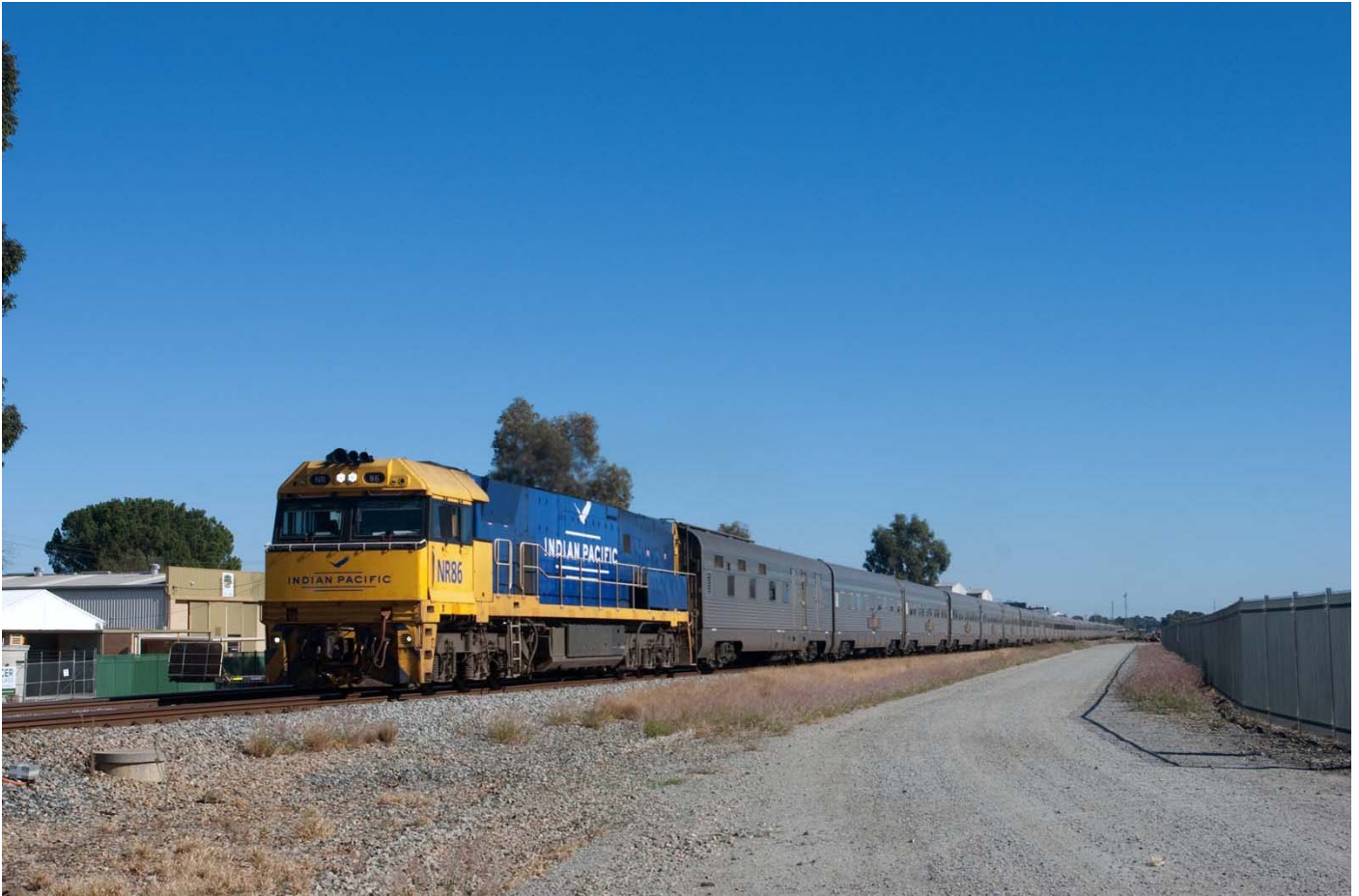
An impressive-length 1PA8 led by NR86 passes through Bellevue, 20 th May.