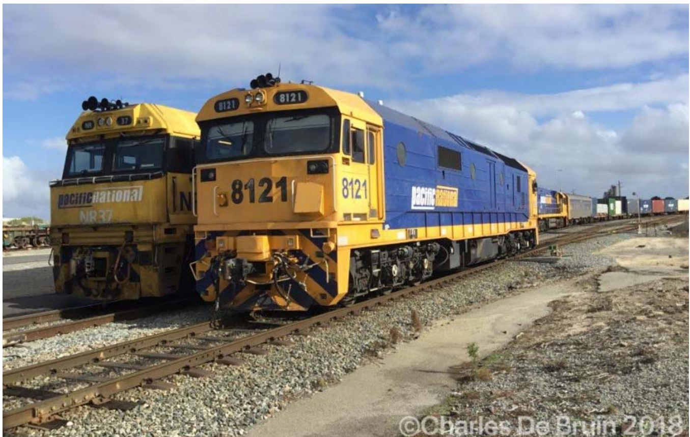
Shunter 8121 pauses beside NR37 on 1PM5, Kewdale, 27 th May.