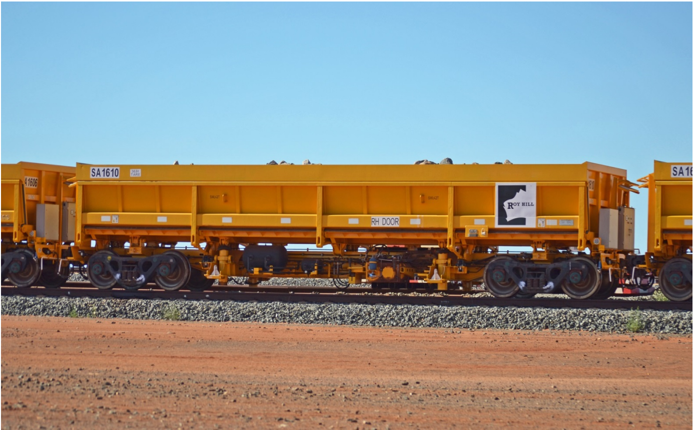
Roy Hill side-tipper wagons, 31 st May.