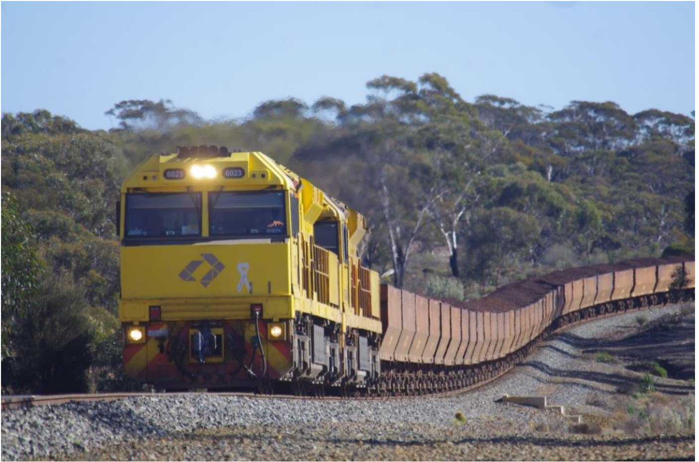
6023 & ACB4406 slingshot through the roller coaster at Widgiemooltha with 2413 loaded ore, 28 th May.