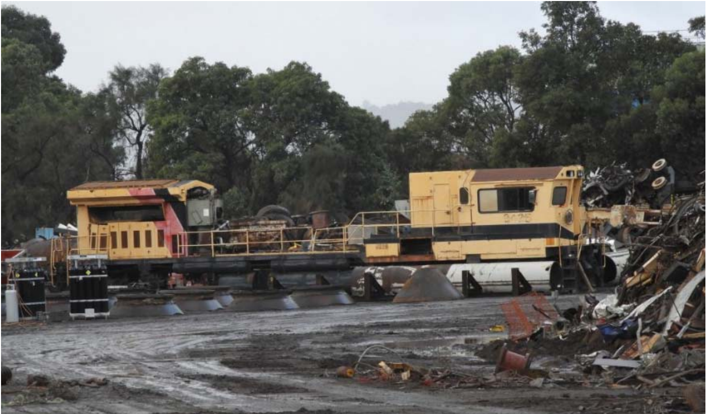
The shell of former Robe River 9425 was moved to CD Dodd scrap yard after sitting at UGL Bassendean for a number of years. 27 th May.