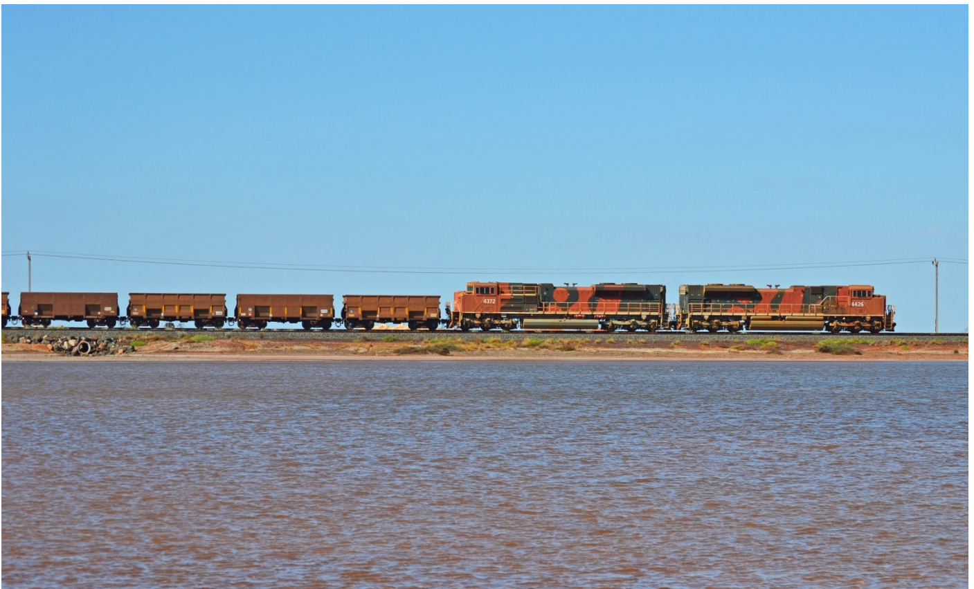
4426 & 4372 depart Hedland Yard with 134 hoppers, to amalgamate with another 134 at Mooka, 31 st May.