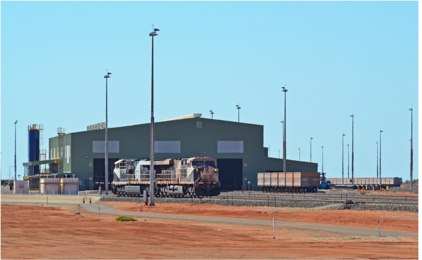
RHAs 1013 & 1011 at Roy Hill loco depot, 31 st May.