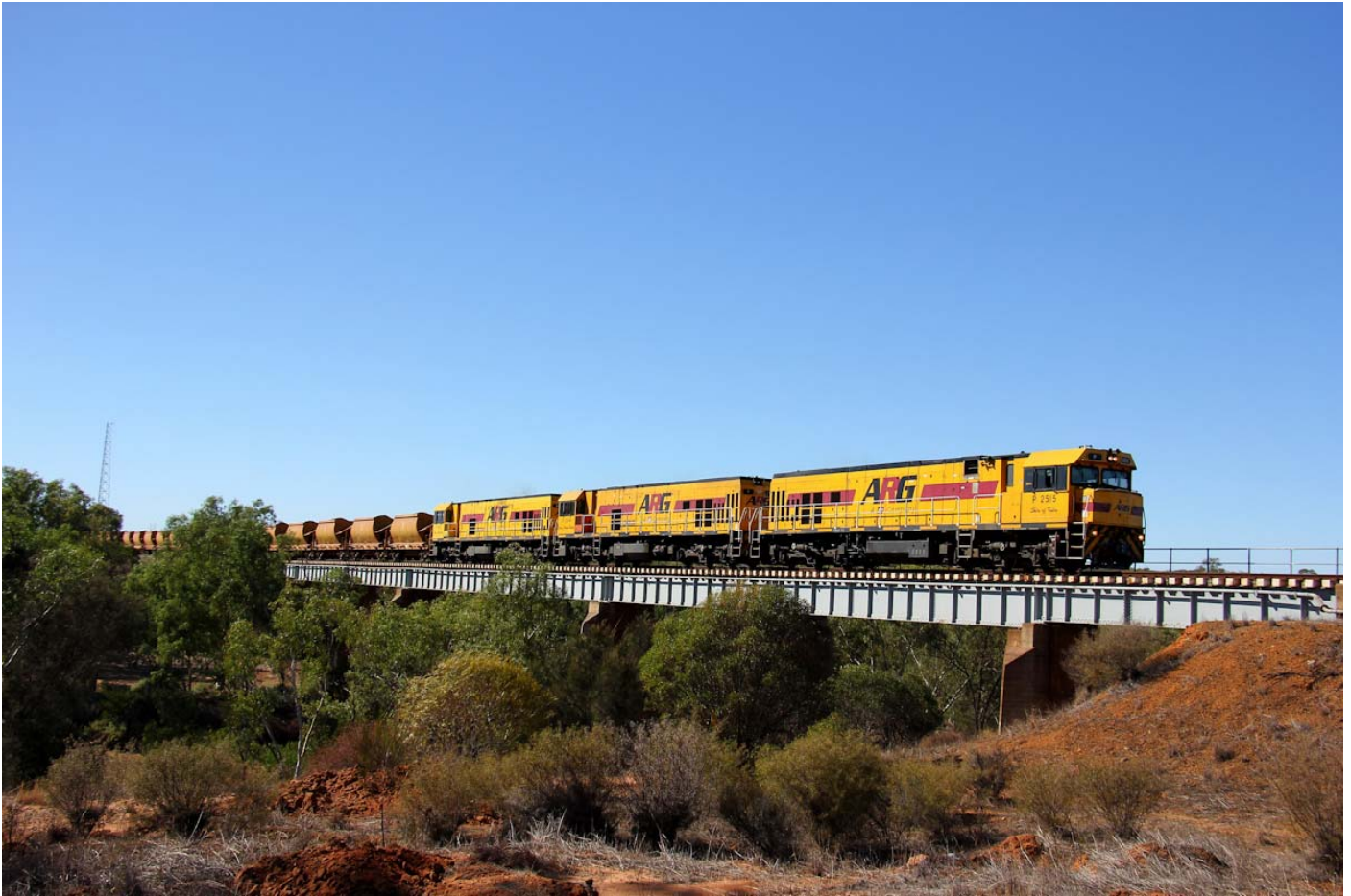
Ps 2515, 2514 & 2511 ease 7721 loaded ore across the Greenough River bridge at Eradu, 19 th May.