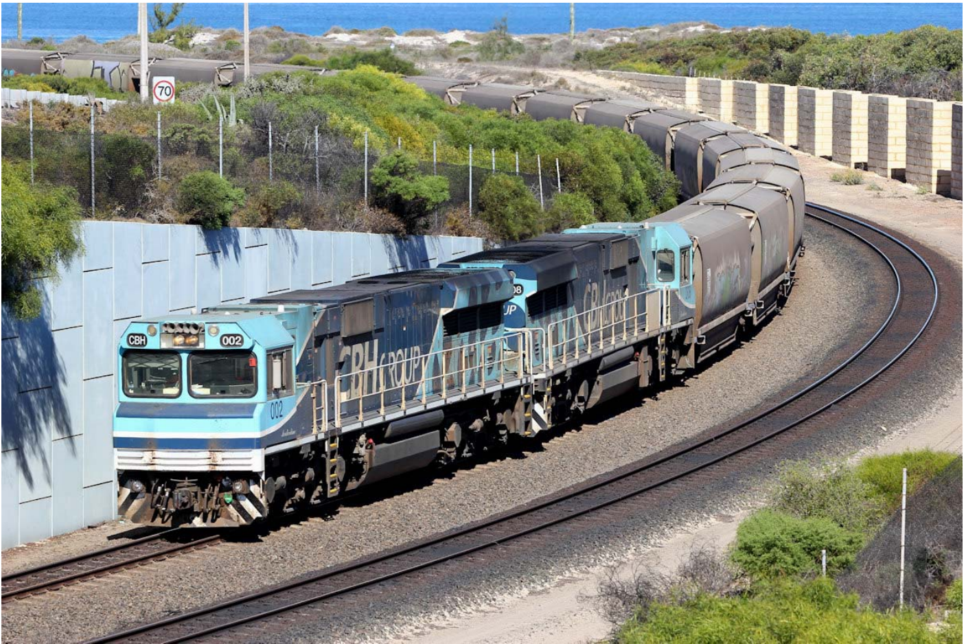
CBHs 002 & 008 approach Geraldton port on 7G51 loaded grain, 19 th May.