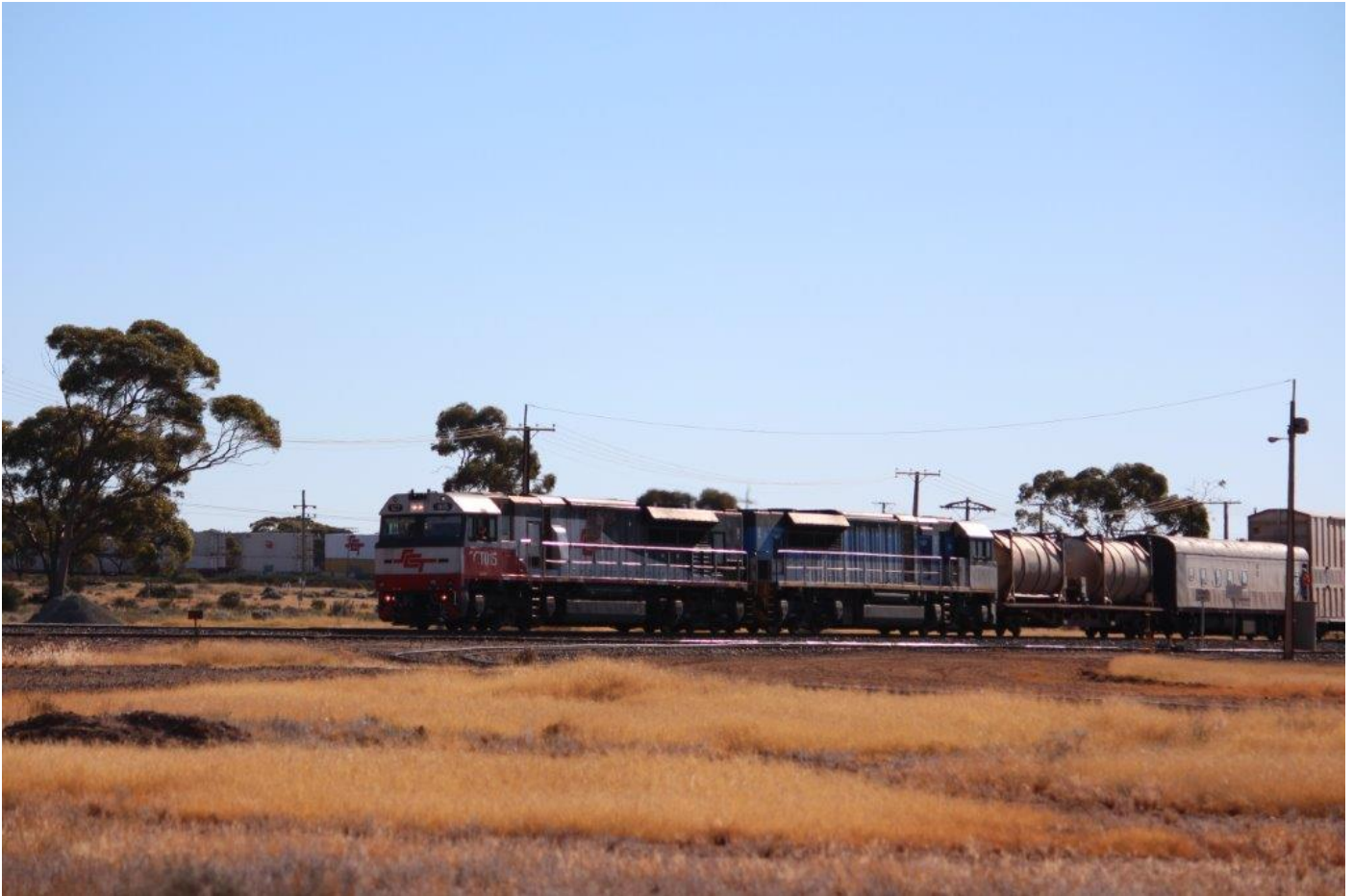
The mid afternoon sun glints off late 6PM9 (SCT015 & LDP001) at Parkeston, 19 th May.