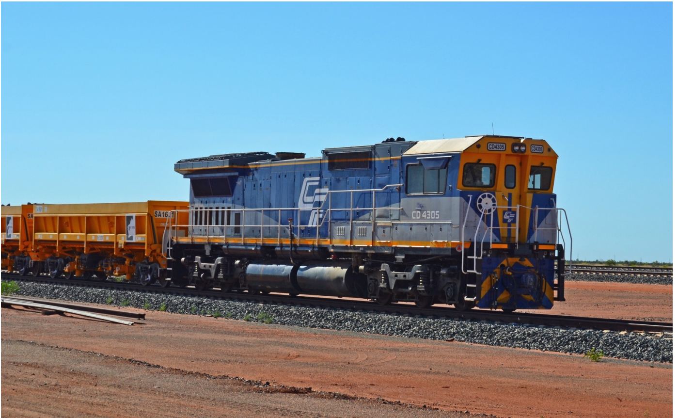
CD4305, Roy Hill Rail Construction Yard, 31 st May.