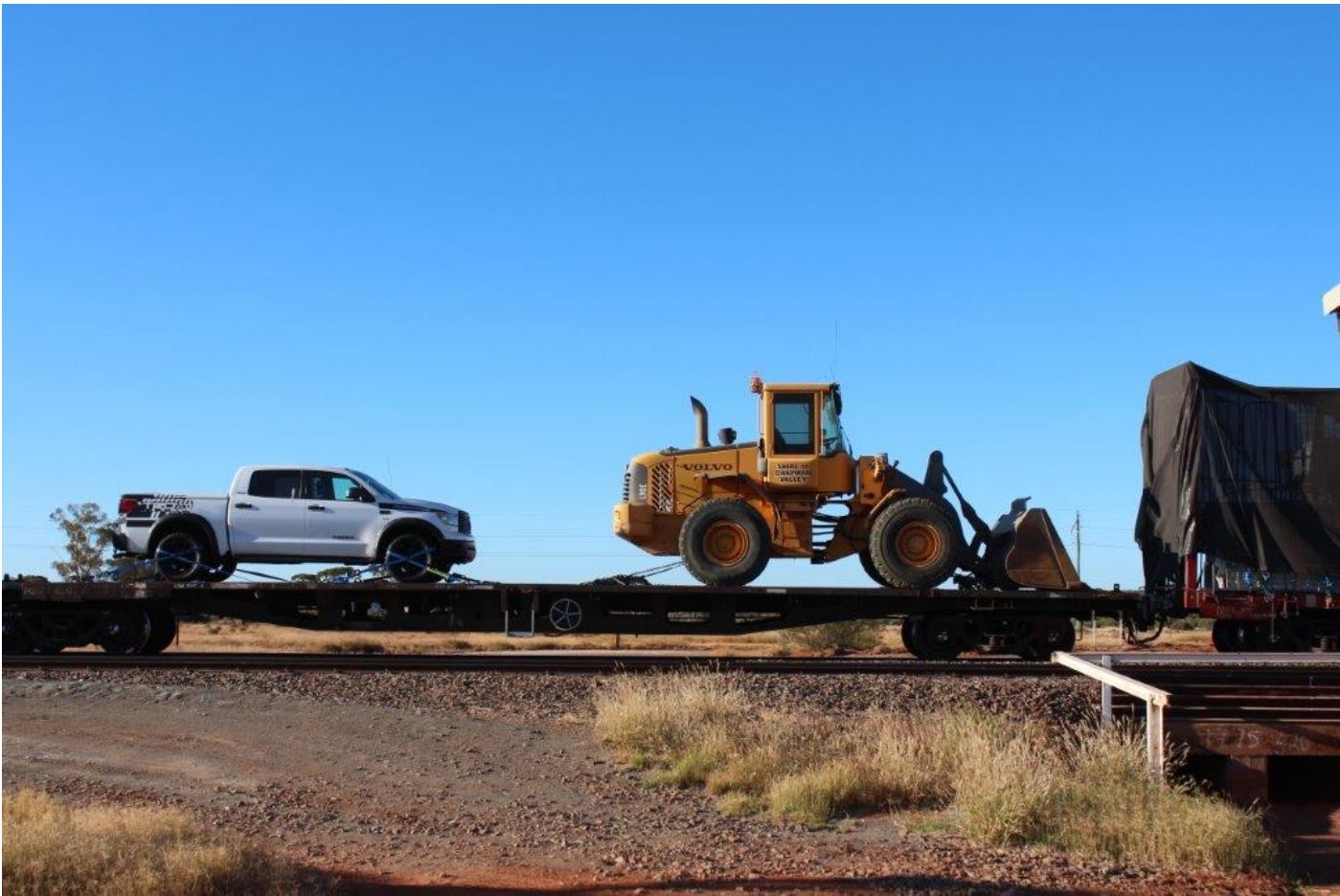
A Shire of Chapman Valley loader aboard 6PM9, 19 th May.