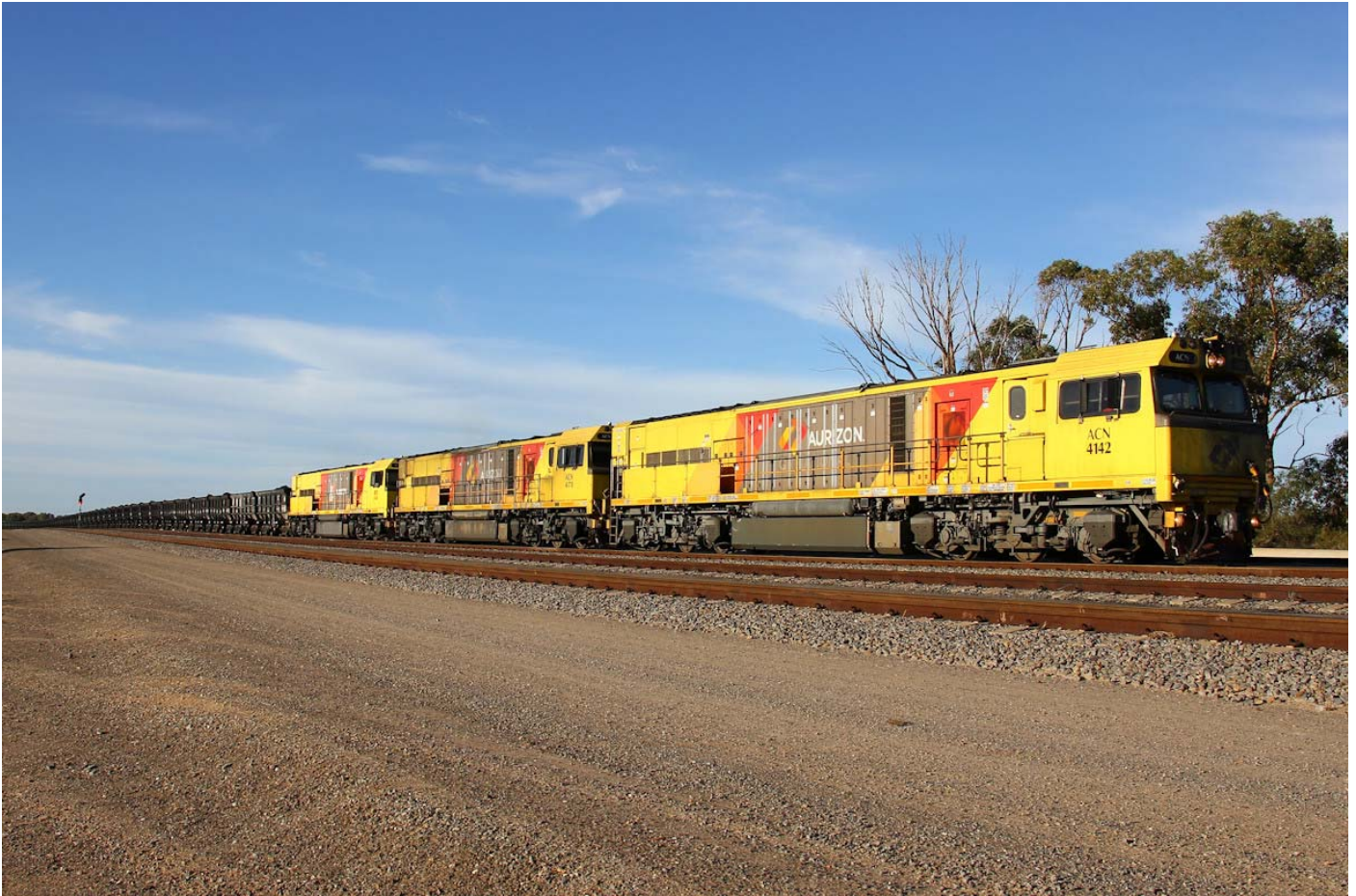
ACNs 4142, 4170 & 4146 on 5767 loaded ore at Narngulu, 31 st May.