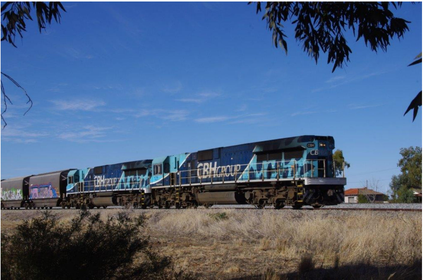
CBHs 121 & 118 on 4556 grain at Kellaberrin, 30 th May.