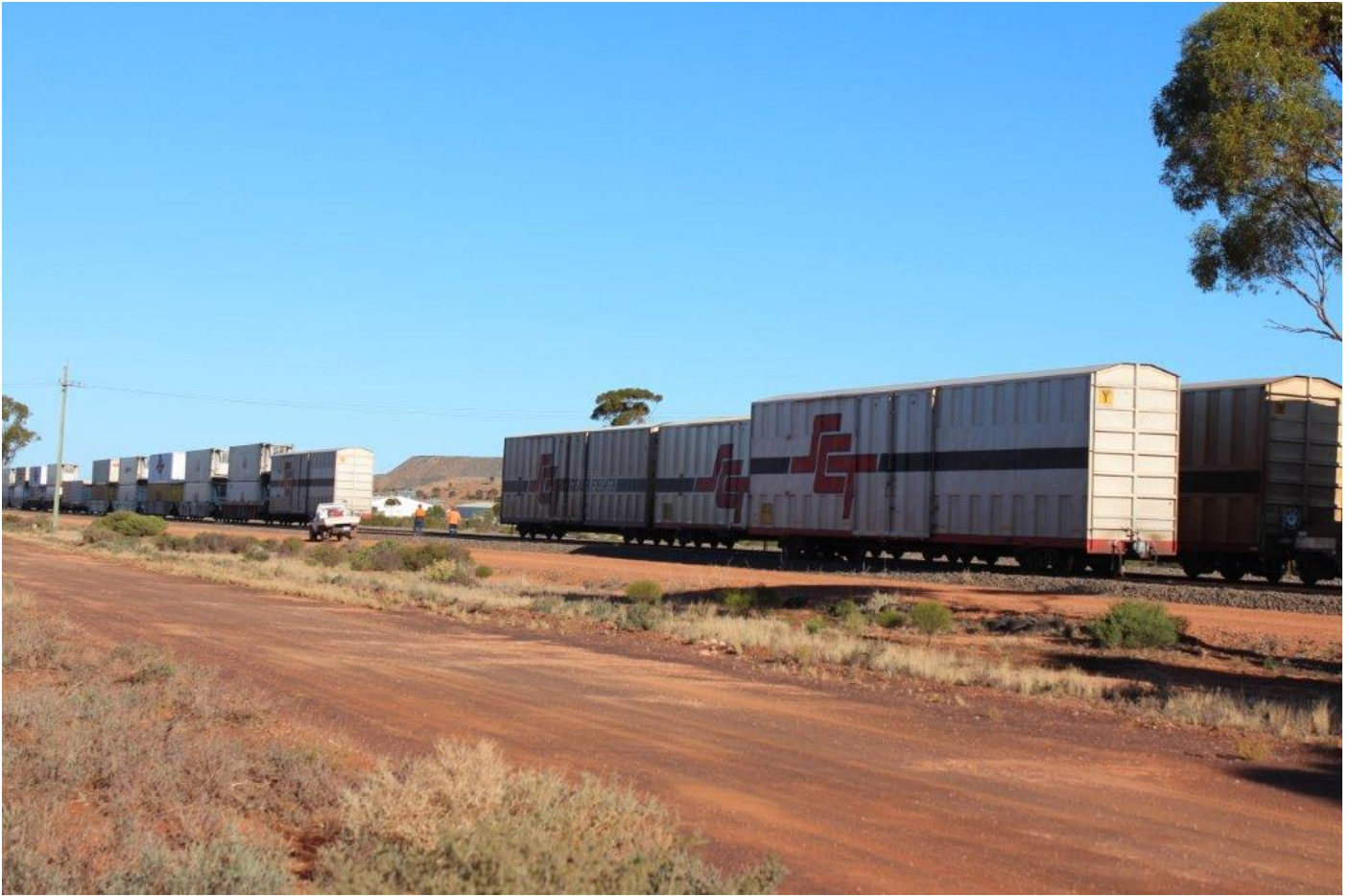
PBHY122B has been shunted out of 6PM9 onto the Parkeston engineer's siding, due to a defective wheel bearing, 19 th May.