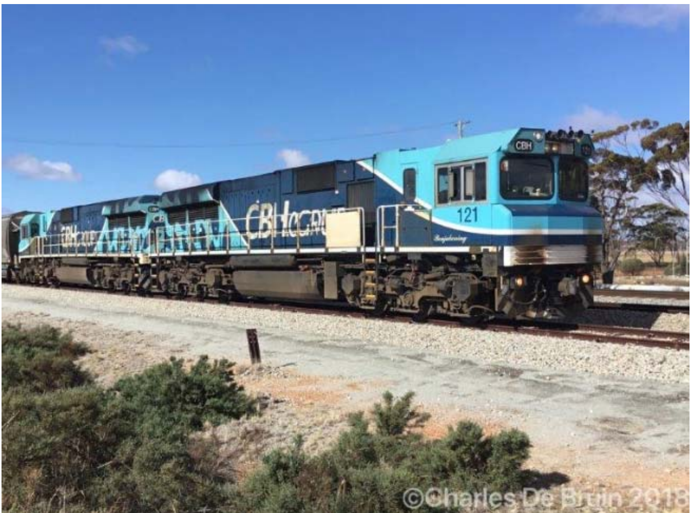
NRs 121 & 118 shunt at Tammin.