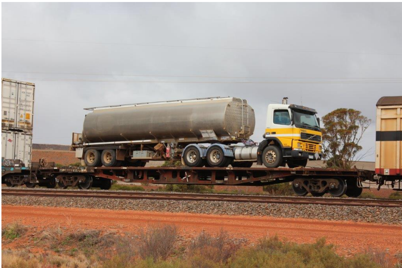
A fuel tanker aboard 6PM9, Parkeston, 26 th May.