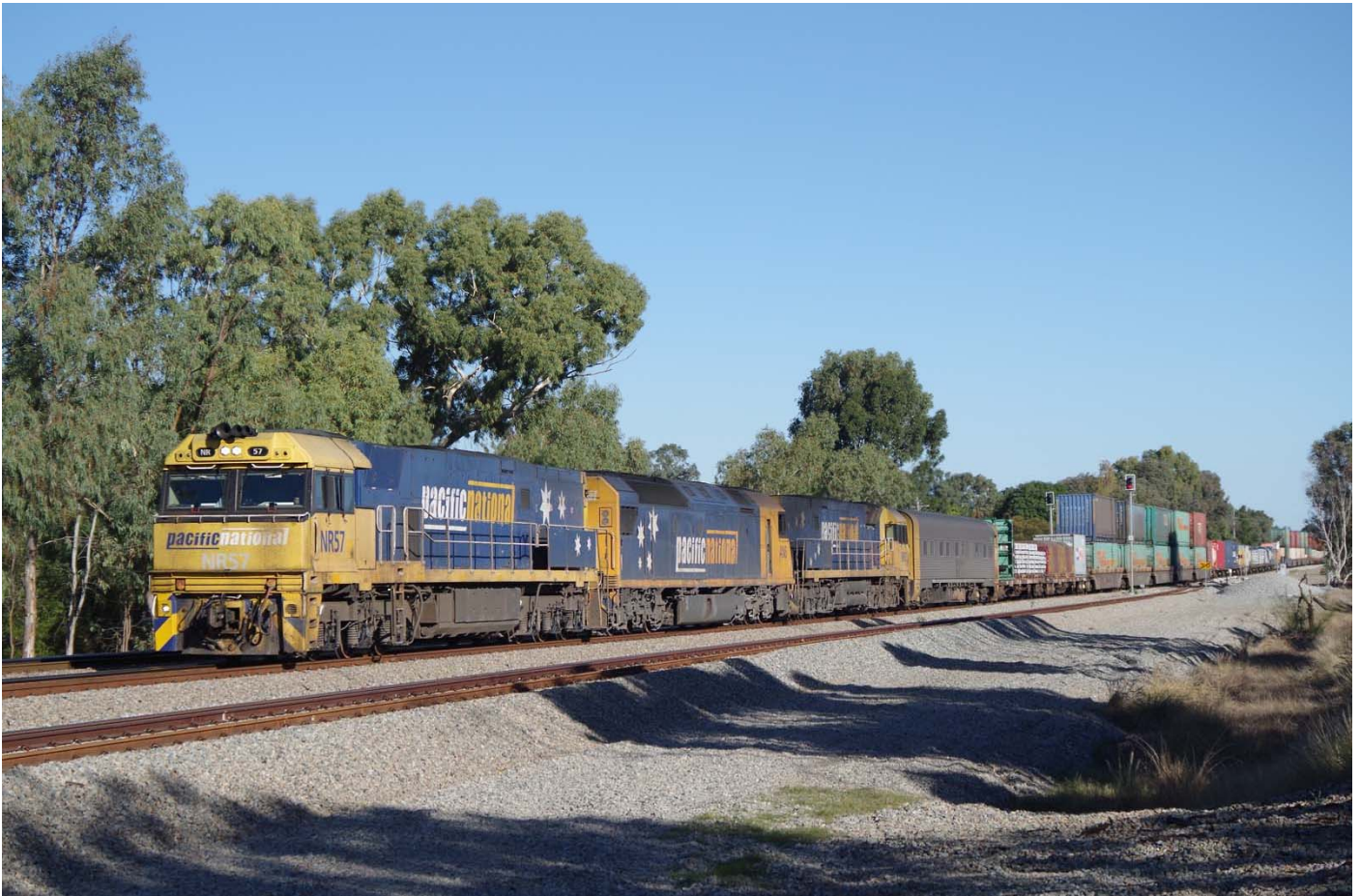
NR57, AN8 & NR51 drag 1PM5 through Woodbridge Junction, 20 th May.