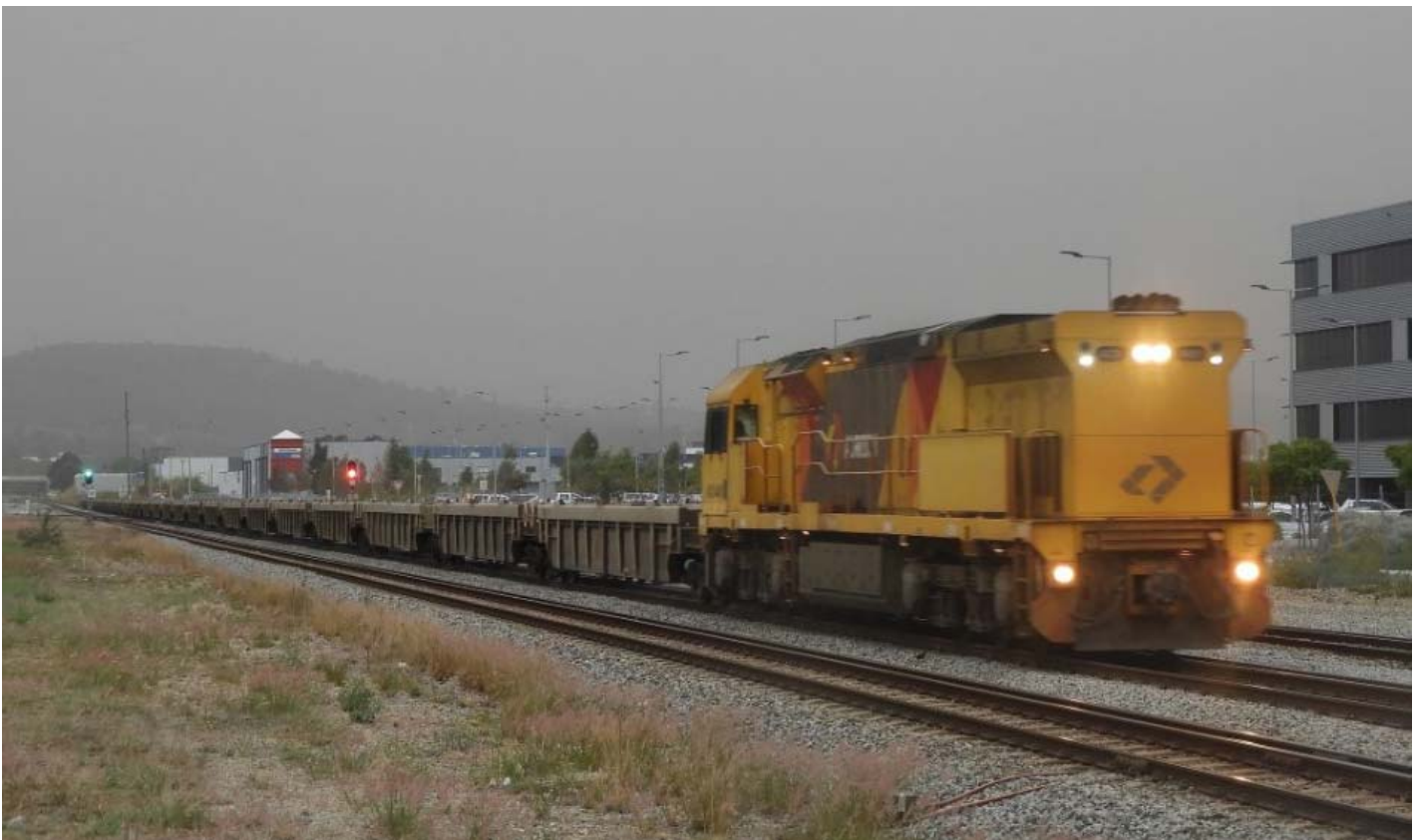
ACB4401 leads a rake of well sets as 5112 from Avon yard to Forrestfield for sale, Midland, 24 th May.