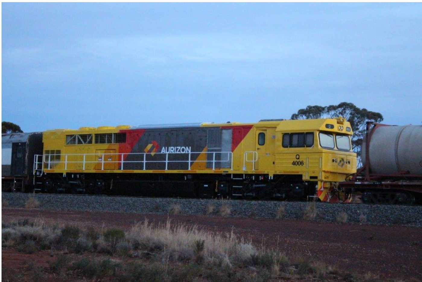
Freshly overhauled and repainted Q4006 on 2MP9 at Golden Ridge at dusk, 30 th May.