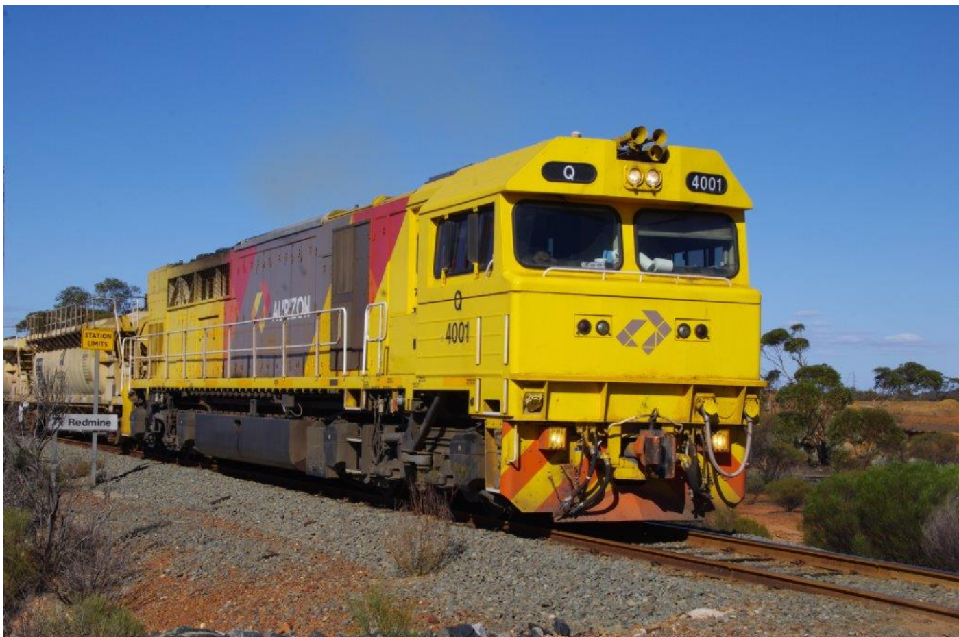
Q4001 with 3438 loaded nickel at Redmine (Kambalda), 29 th May.