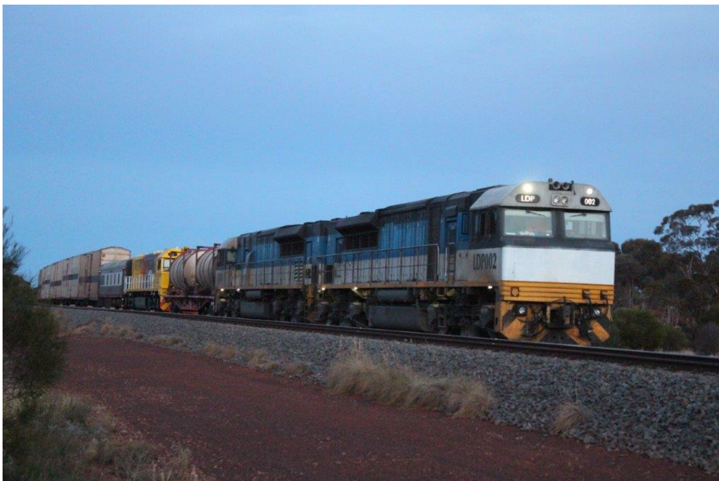
LDPs 002 & 003 with Q4006 on 2MP9 wait at Golden Ridge for 2SP7 to overtake, 30 th May.