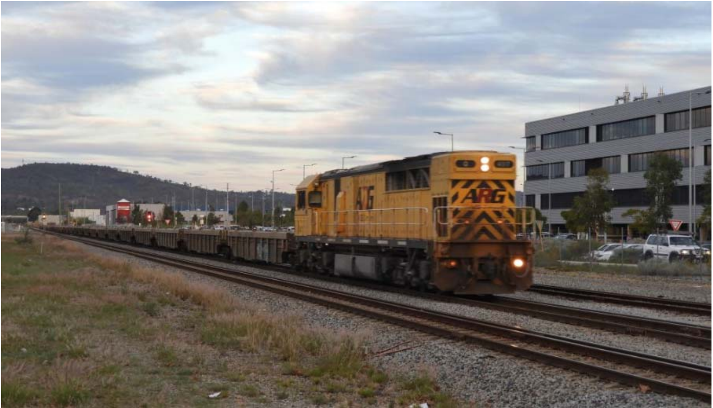
Q4017 leads 4112, another movement of well sets from Avon Yard to Forrestfield for sale, 30 th May.