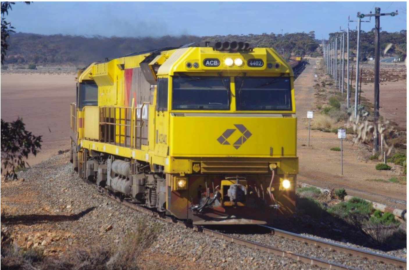
ACB4402 & AC4306, DPU ACC6030 & AC4301 power 2414 empty ore across Lake Cowan, 29 th May.