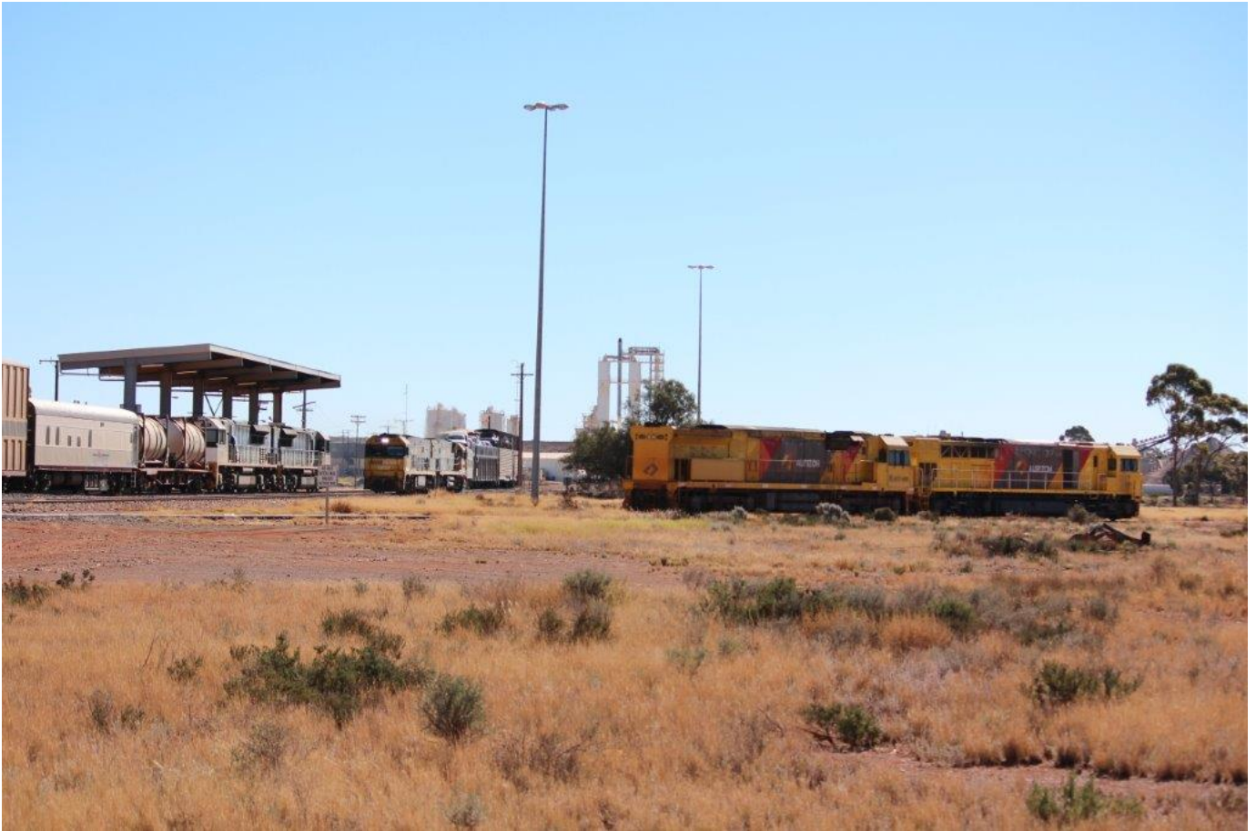
NRs 59 & 6 bring 6PM6 around the big curve into Parkeston for a cross with 5MP9 (LDPs 002 & 003) while stabled Q4011 & ACB4406 wait on the triangle to form 7C74 later that afternoon, May 19 th .