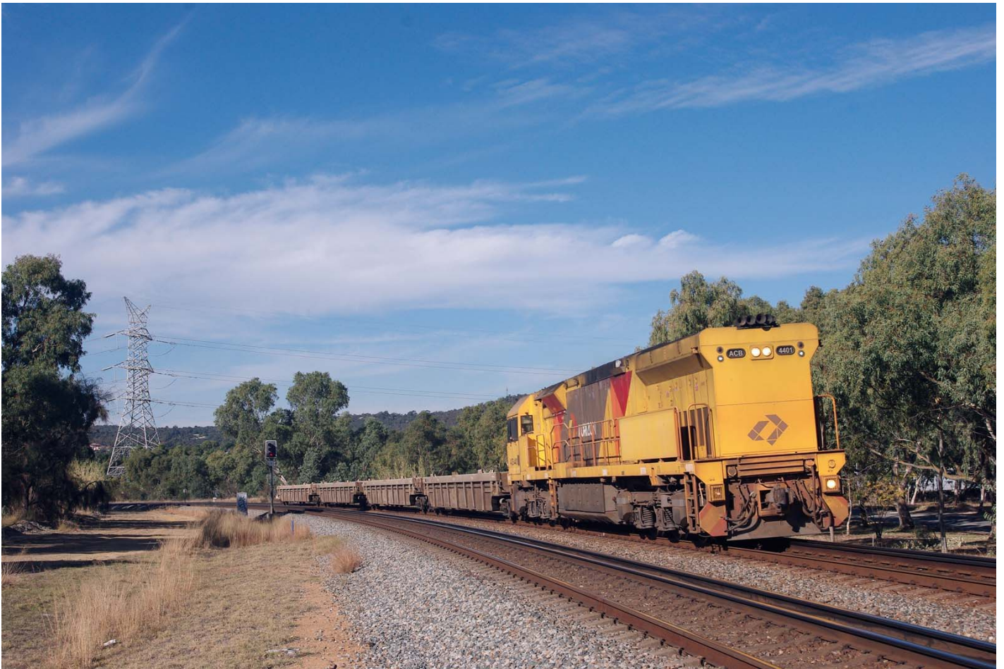
ACB4401 and two QQWY well pairs form 4112 through Bellevue, 23 rd May. The well sets were for inspection by prospective buyers; apparently SCT have since purchased thirty of the sixty sets and returned their hired CFCLA wells.