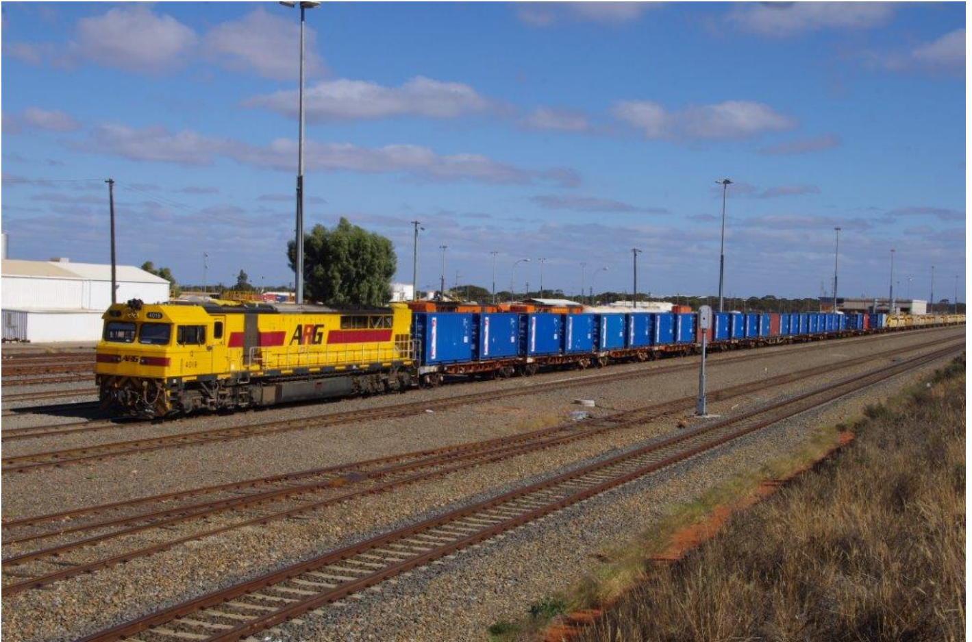
Q4019 on Lynas rare earths containers and WNs for 2479 to Leonora early the next morning, 27 th May.