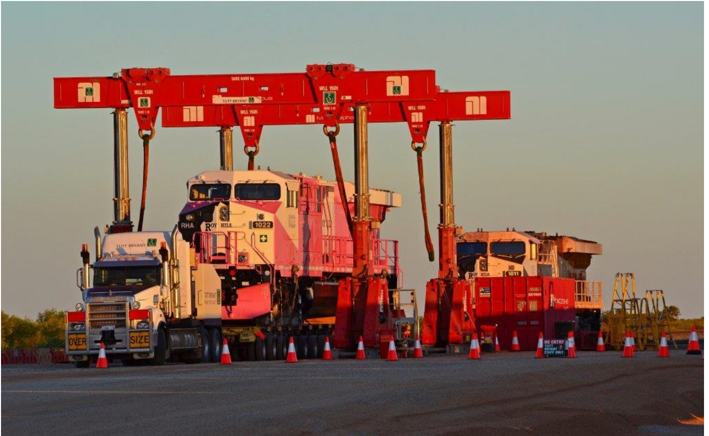
Preparing to transfer RHA1022 to rail at Roy Hill Flashbutt Yard, RHA1011 stands by to haul it away, 7 th September.