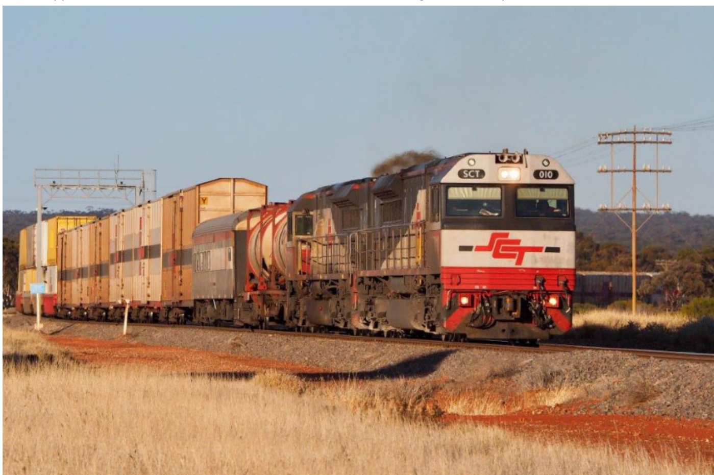
3MP9 hauled by SCTs 010 & 003 departs Parkeston, 6 th September.