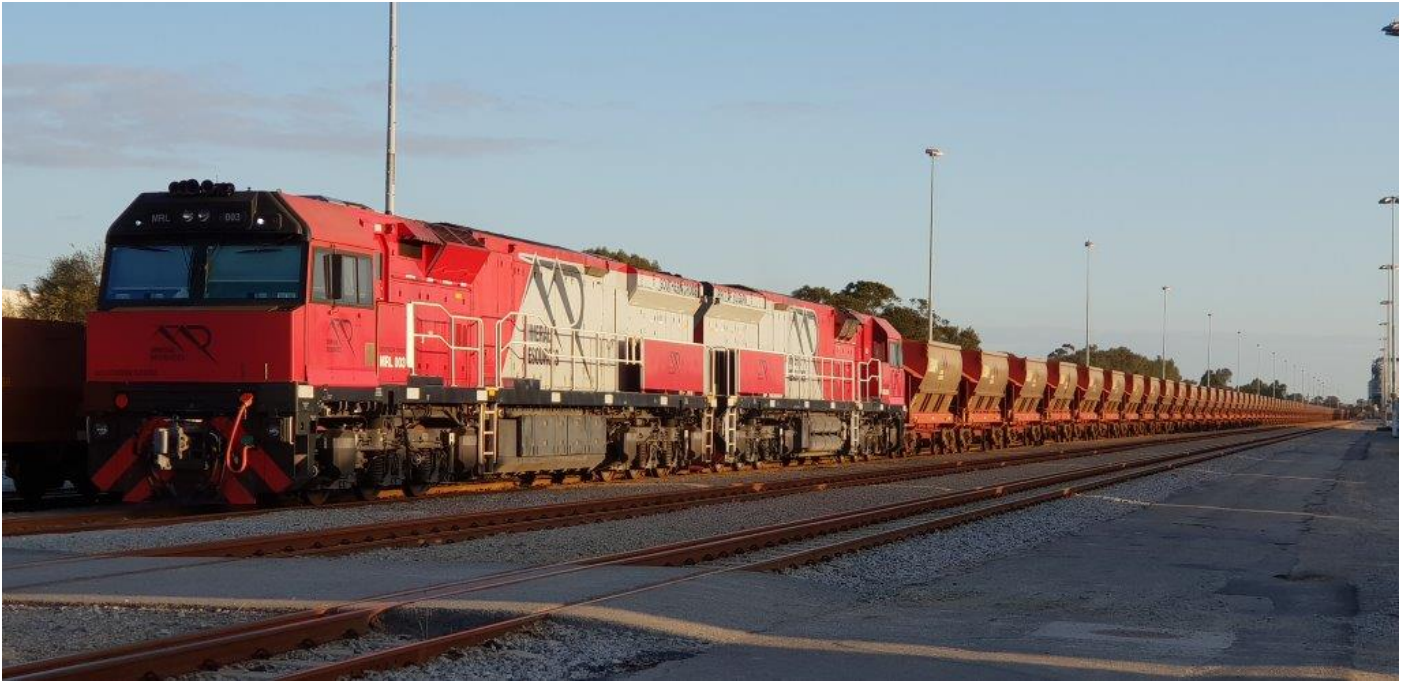
An MRL train was loaded from the ore stockpile remaining at Kwinana in mid September. MRLs 003 & 002 stabled with the loaded train at Forrestfield for a day or two, seen here on 14 th September, departing for Esperance the next morning.