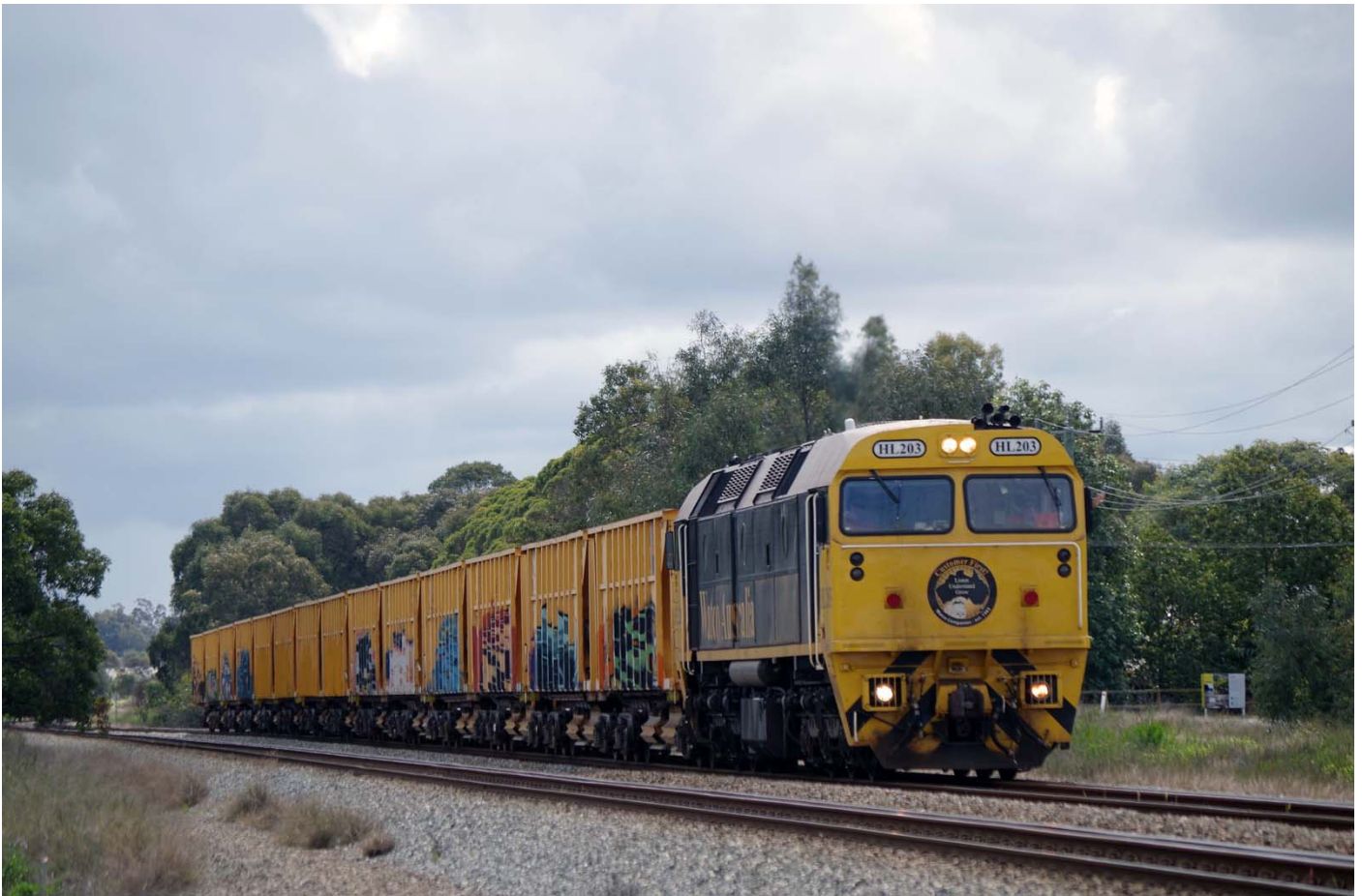
HL203 powers 7BT6 ballast through Middle Swan, 8 th September.