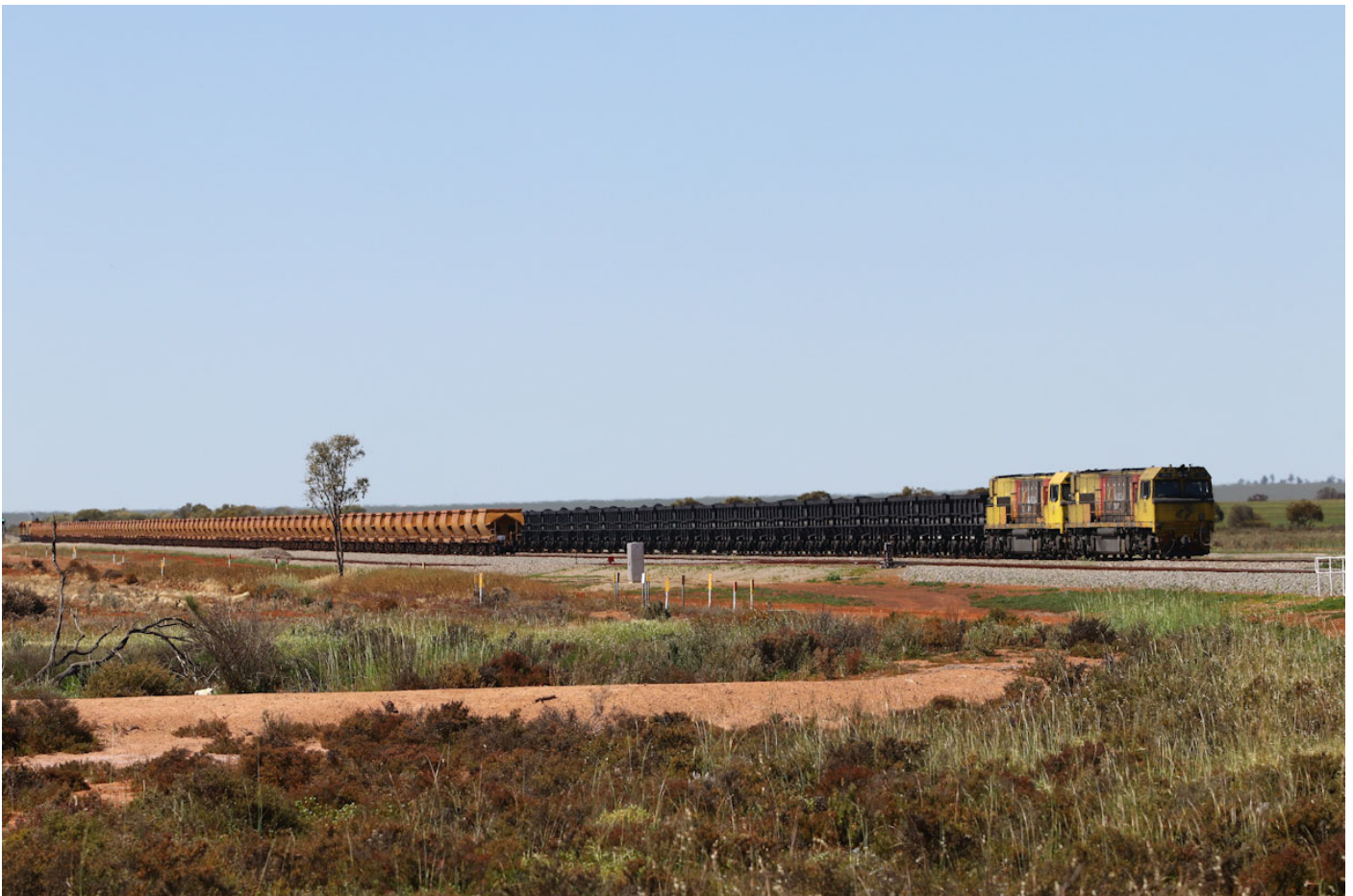
ACNs 4150 & 4171 (4145 DPU) on 1763 loaded Karara ore cross Ps 2503, 2517 & 2511 on 1720 empty Mt Gibson rake at Tenindewa, 16 th September.