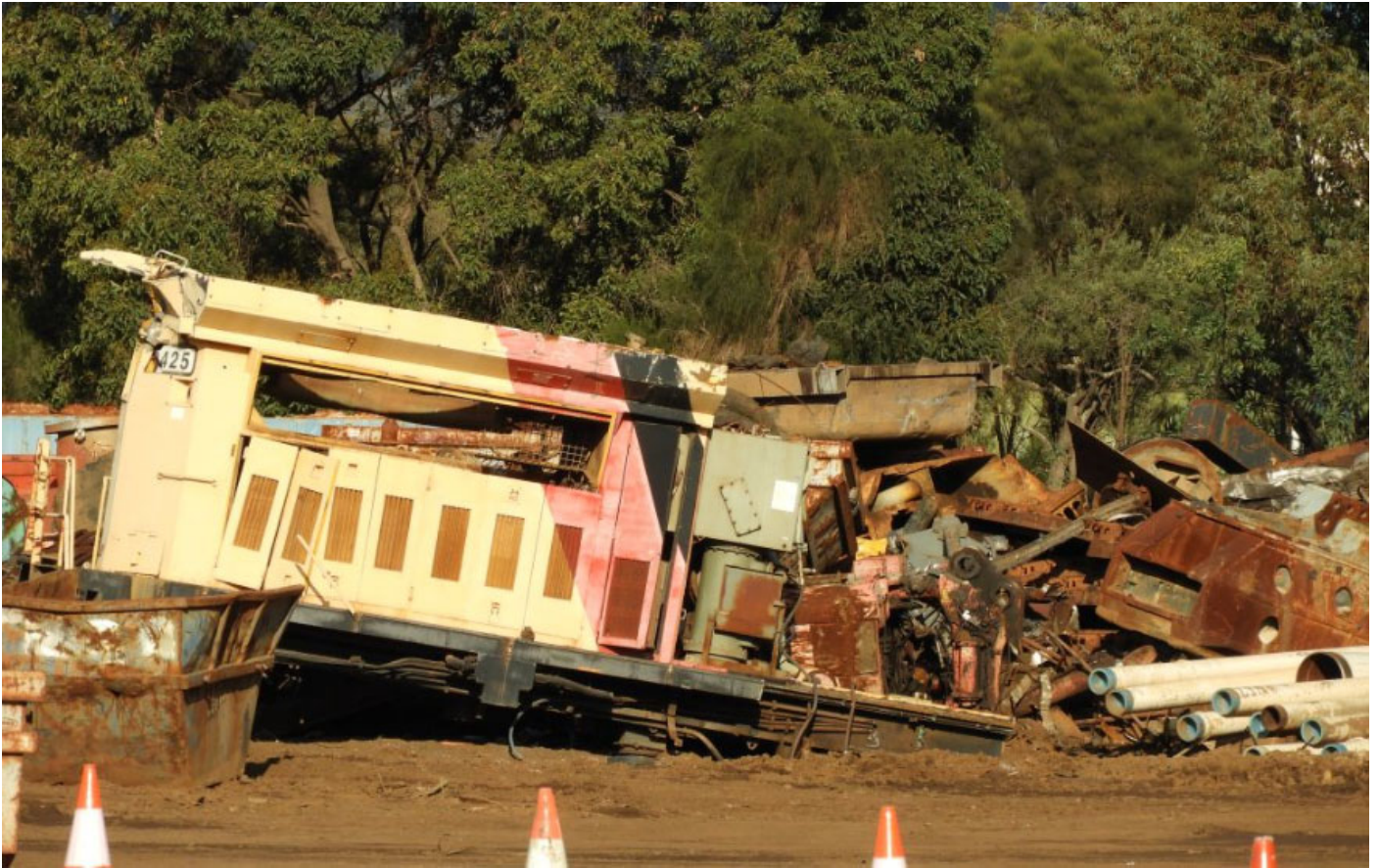
Built in April 1970, cut up in mid 2018. Originally Mt Newman M636 # 5468 then sold to Robe in mid 1982 and renumbered 9425; rebuilt as model CM40-8M in 1989. DC Dodd scrapyard, Forrestfield, 1/9.