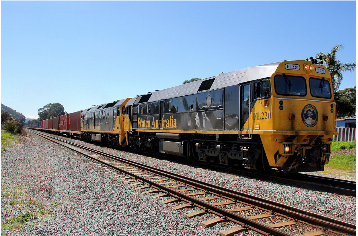
FL220 and G511 at Thornlie with a container train, 1 st September.