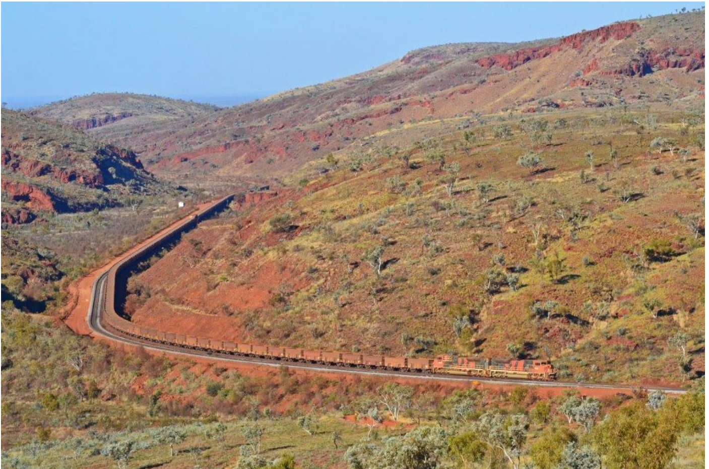
An empty ore climbs through Kurrajurra behind 4424 & 4473, DPU 4467 & 4353, 5/9.