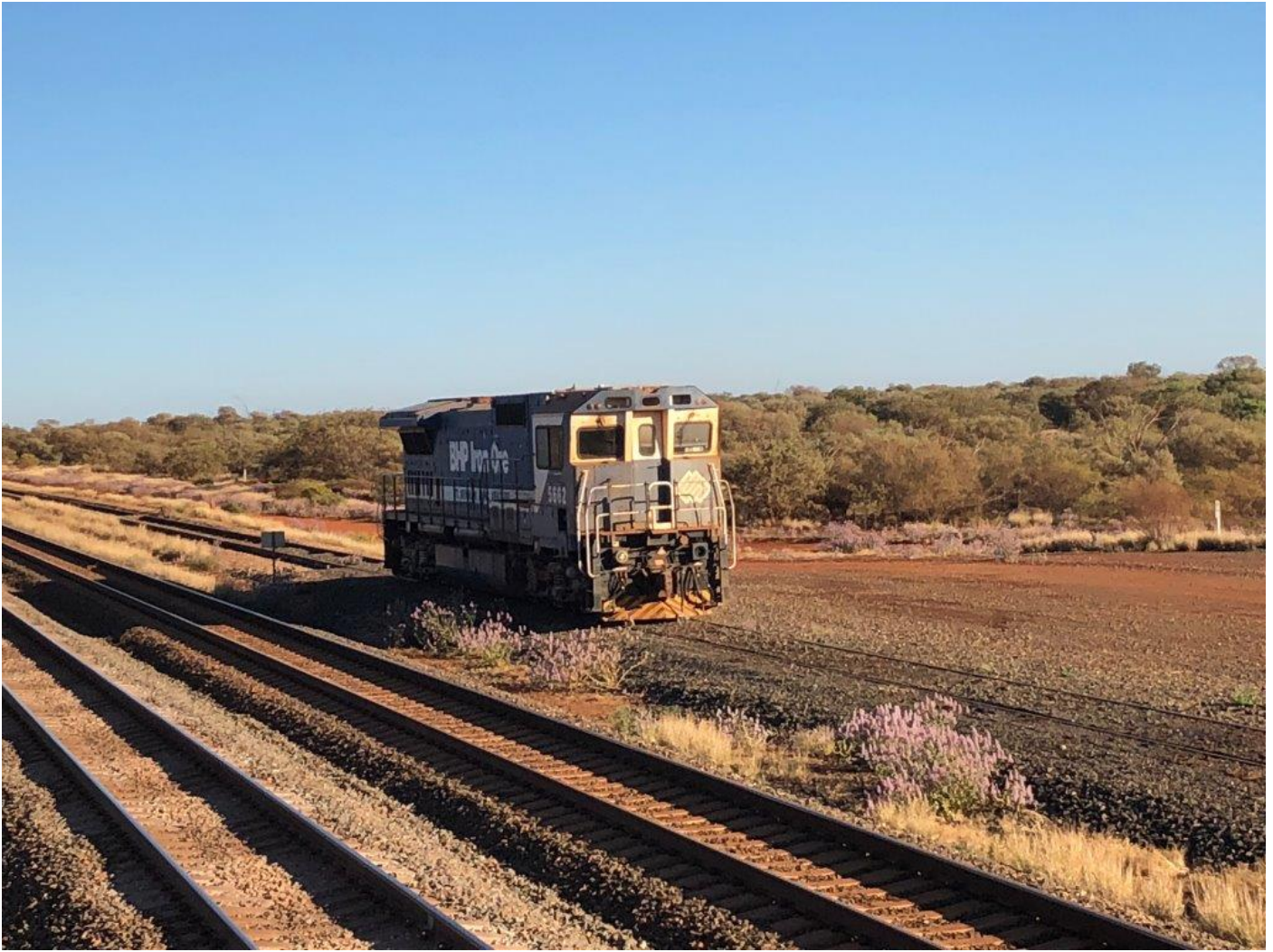
Stored 5662 was moved to the hardstand at Gidgi for scrapping, 5 th September.