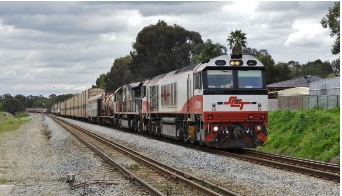
CSR001 & SCT012 lead very late 3MP9 through Hazelmere, 6 th September.