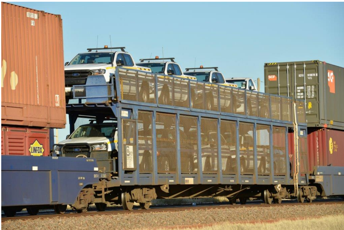
Five identical new vehicles heading to join a company's fleet, Parkeston, 7 th September.