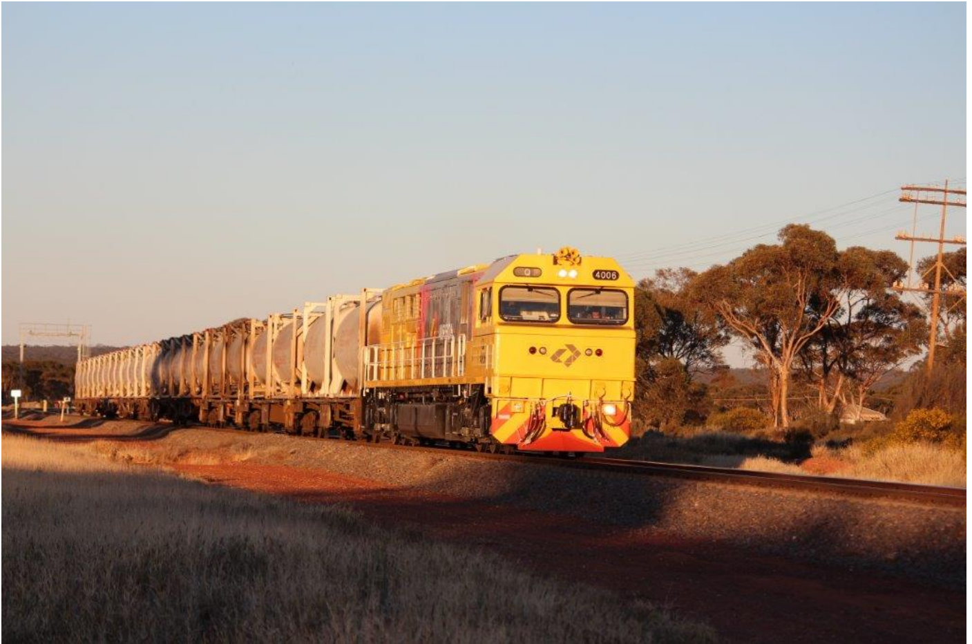
Clean Q4006 catches the evening sun as it approaches Yarri Rd level crossing with 1C74 from Parkeston to West Kalgoorlie, 16 th September.