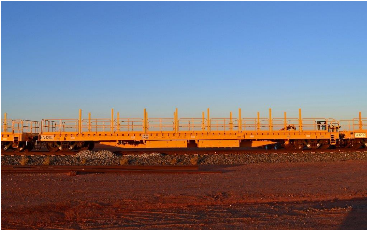
Roy Hill flat wagon FA1205, 7 th September.