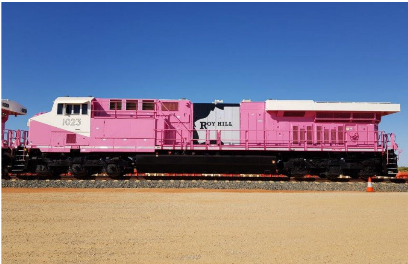
RHA1023 (and rear of RHA1022), 15 th September.