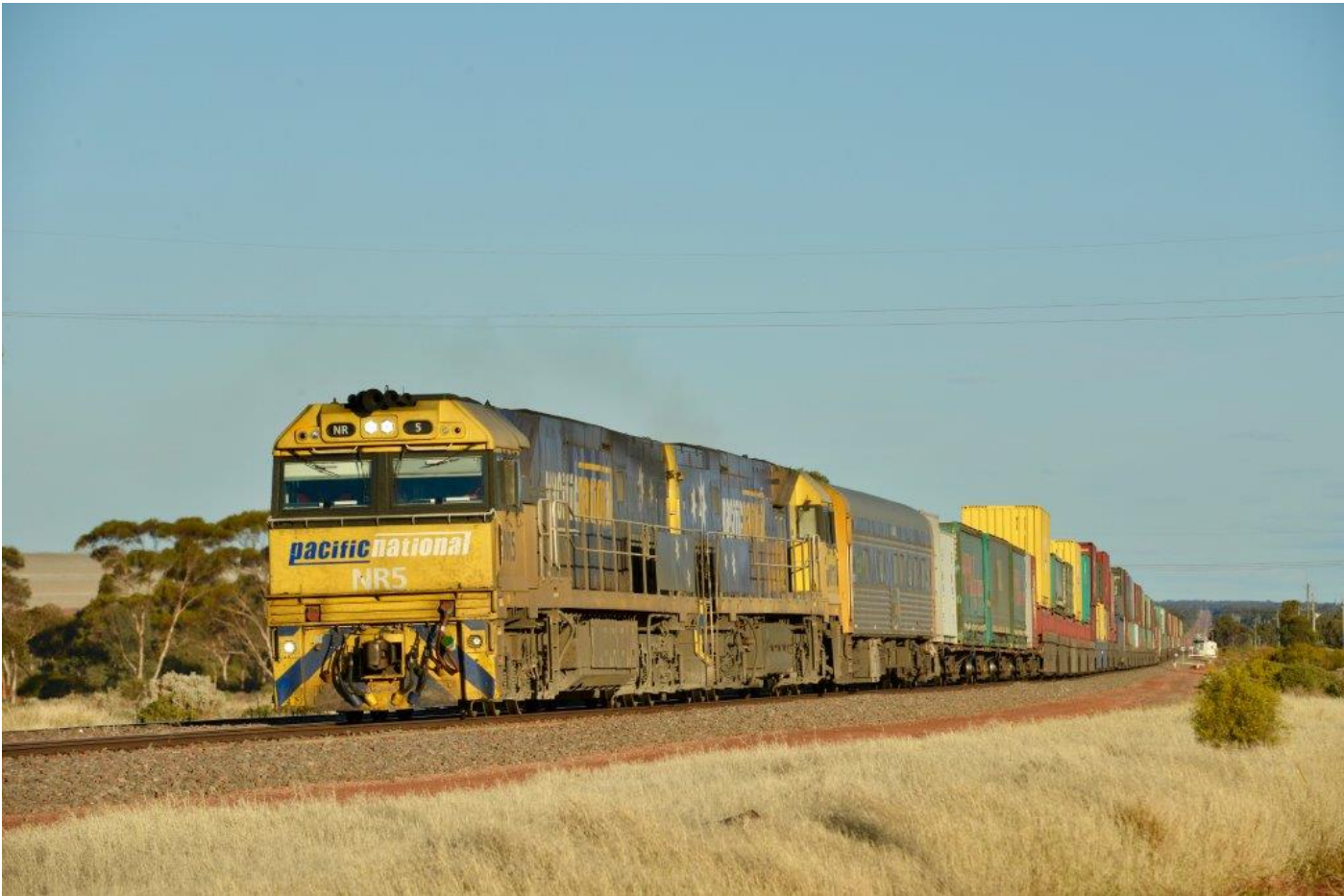
NRs 5 & 119 arrive at Parkeston with 4MP5, 7 th September.