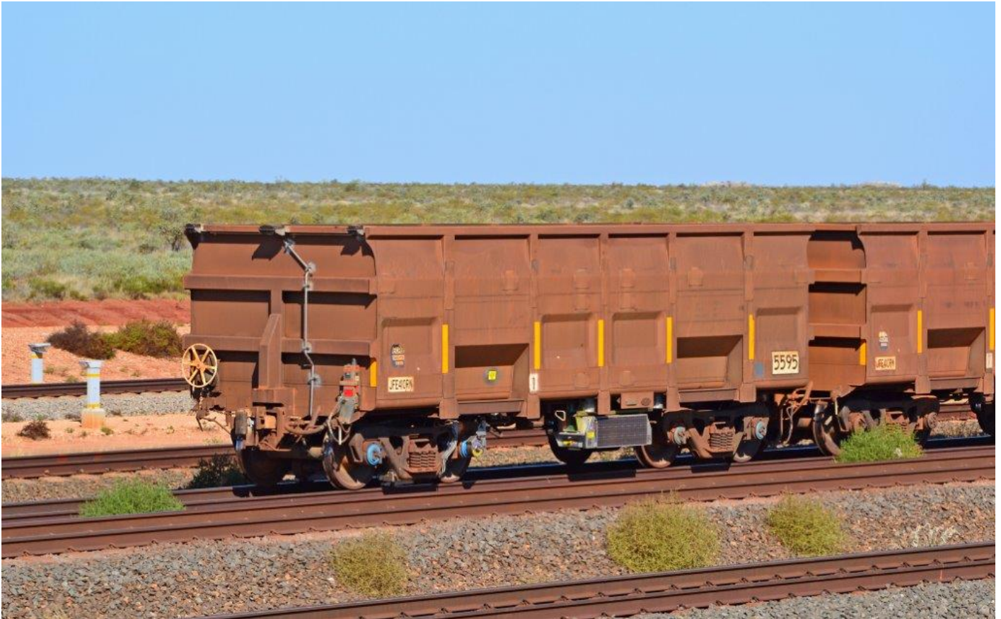
BHP rakes now all have a permanent last car, fitted with end-of-train marker, broken rail detector mounted under the rear bogie and ECP braking monitor, as seen on QRRS5595. The piping leads to an antenna, the battery and solar panels power the BRD. 10 th September.