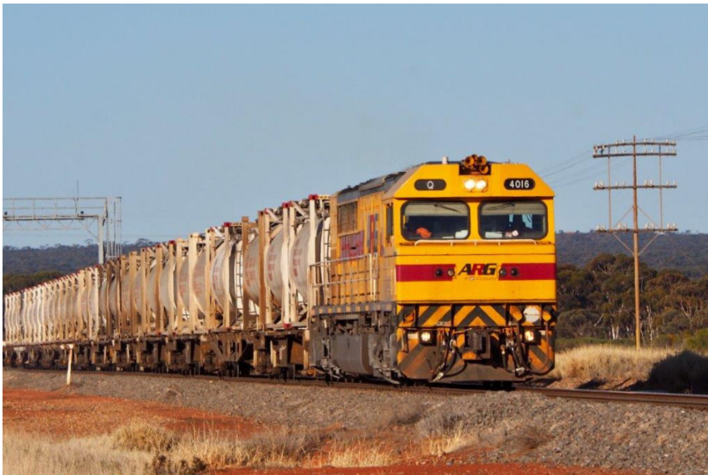
Q4016 approaches Yarri Road with 5C74 from Parkeston to West Kalgoorlie, 6 th September.