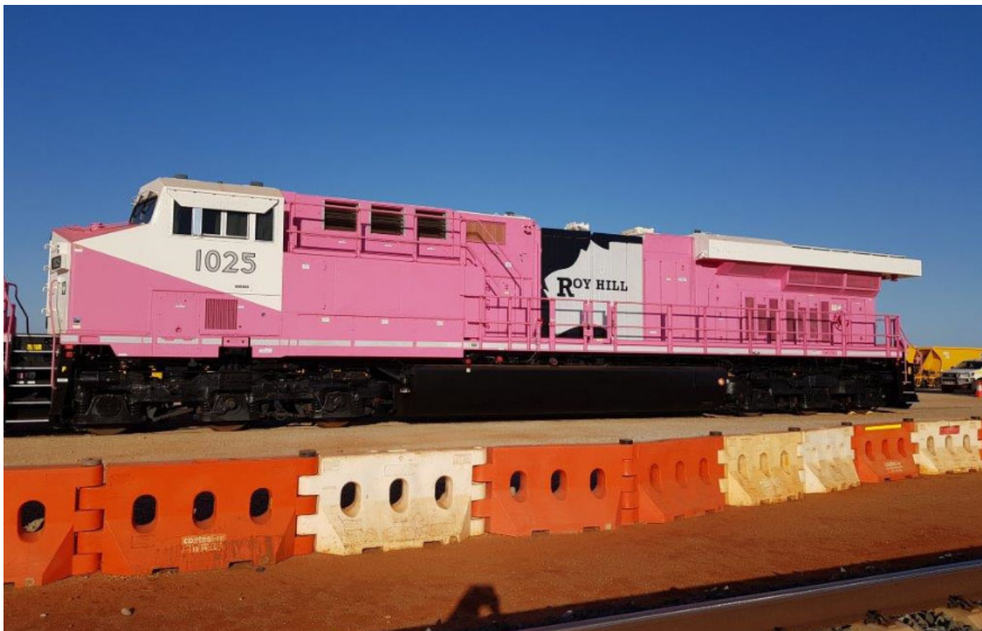
RHA1025 as clean as it's ever going to be, 26 th September.