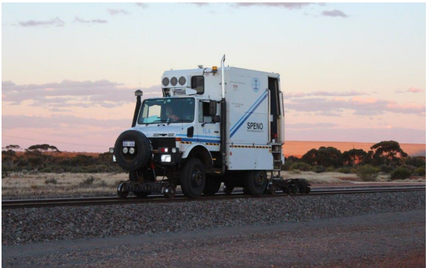
After ultrasonically testing the rails across the desert for defects, the Speno rolls into Parkeston at sunset, 3 rd September. An attendant hyrail is following a short distance behind.