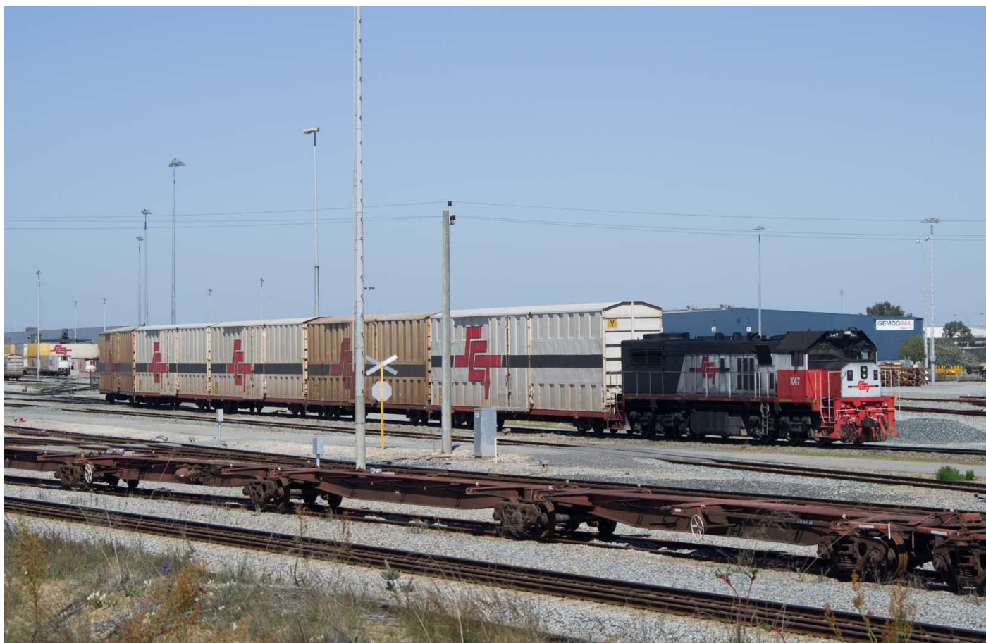
Much-travelled X47, now with SCT, shunts Forrestfield, 16 th September.