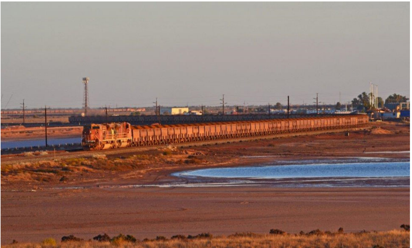
4367 & 4436 approach across the saltflats at Redbank Bridge with a loaded ore as a southbound empty in the far background approaches the Goldsworthy bridge, 11 th September.