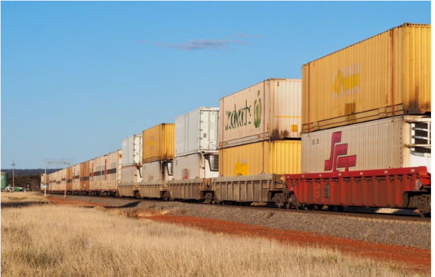
The height of double-stacked wells on PM's MP5/PM6 services and all SCT workings never fails to impress bystanders; SCT more so with their hi-cube vans adding to the impression of a massive wall of steel. 3MP9 was typically well-loaded (pun unintended) on 6 th September.