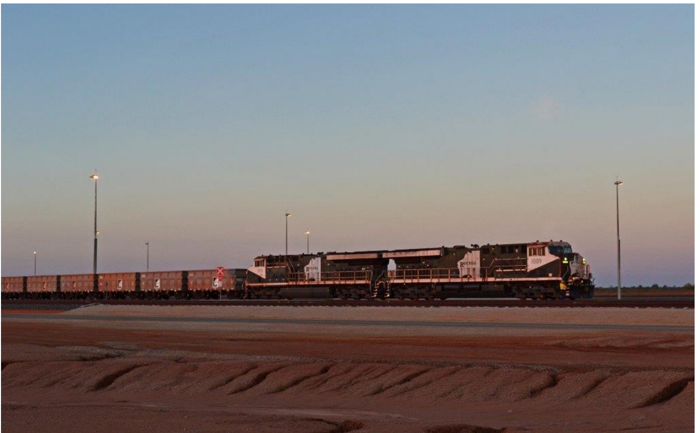
Roy Hill's RHAs 1009 & 1019 prepare to depart Terminal Yard with an empty rake to the mines, 7 th September.