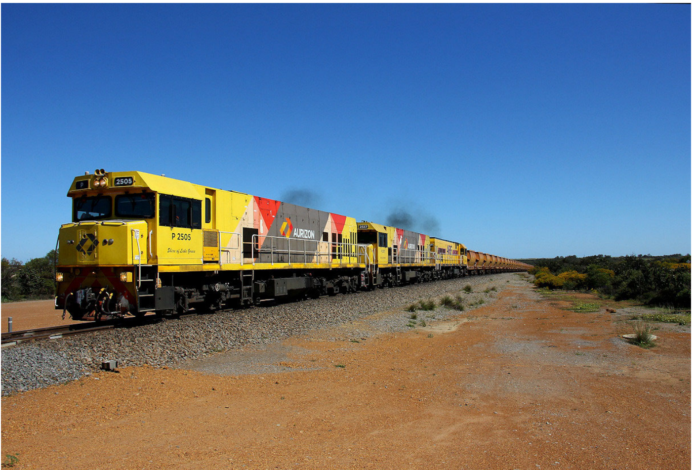
Ps 2505, 2517 & 2511 haul train 7720, Mt Gibson empties, through Northern Gully, 15 th September.