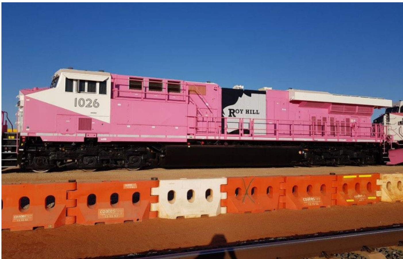
RHA1026 joins the lineup awaiting entry to service, 16 th September.