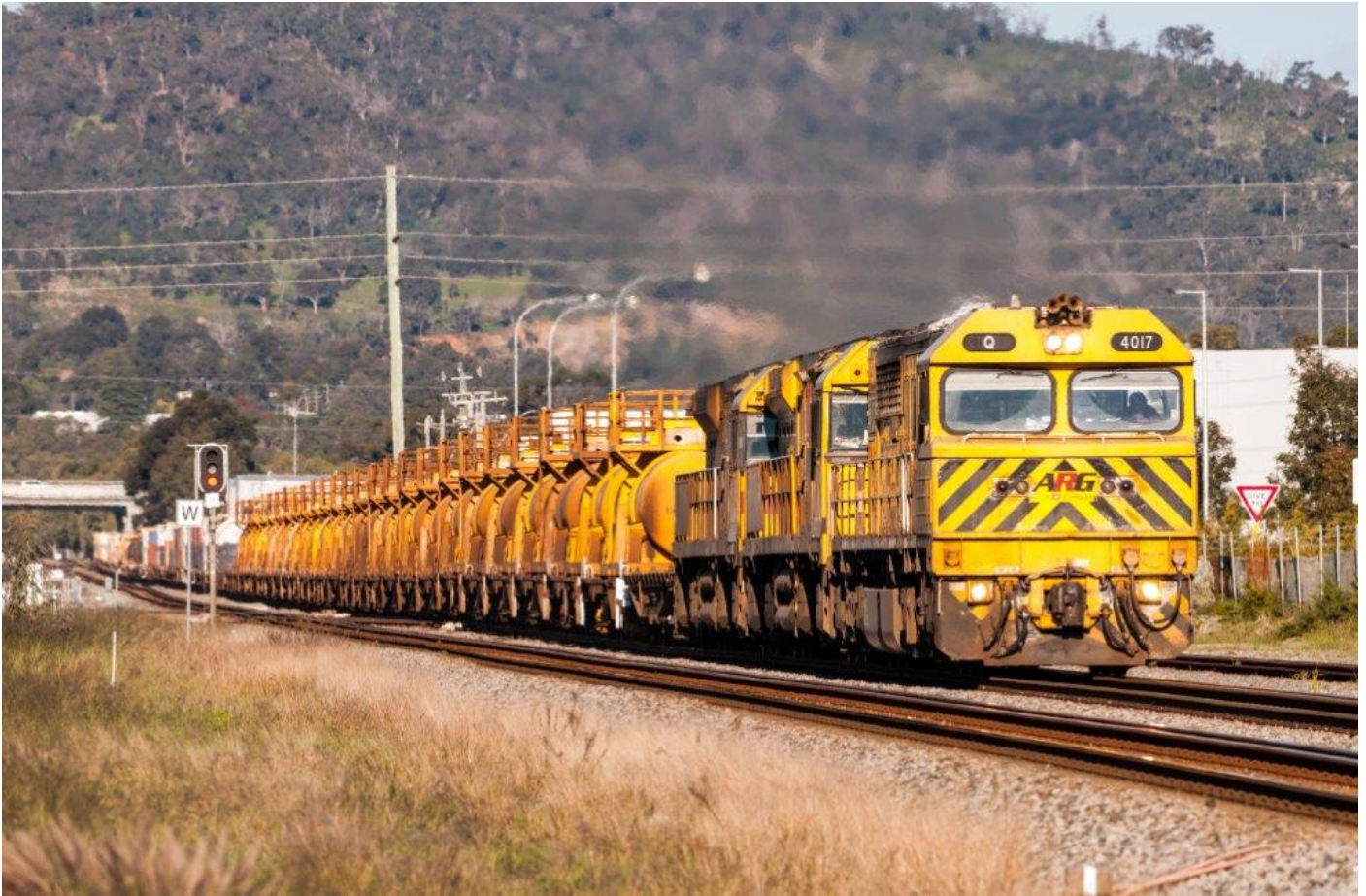
Q4017 leads ACC6030 and AC4307 on a 10-hour late 7426 freight from Kalgoorlie at Midland, 2/9. The AC had failed overnight at Kellerberrin and the Q was sent to the rescue.