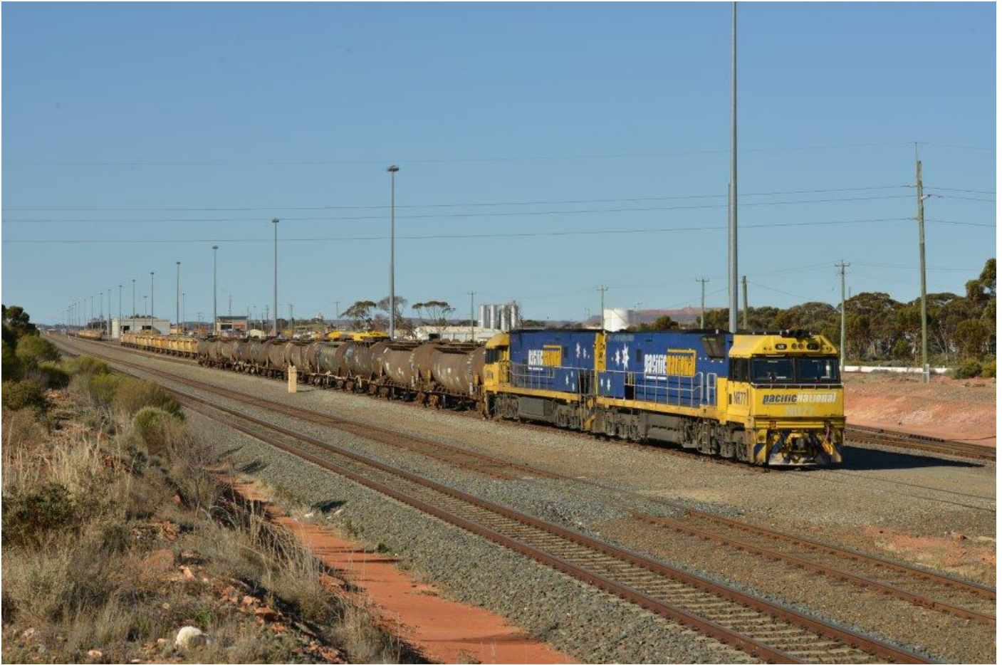
NRs 77 & 89 wait to depart West Kalgoorlie with an unusually short 6445 empty fuel to Esperance, 7 th September.