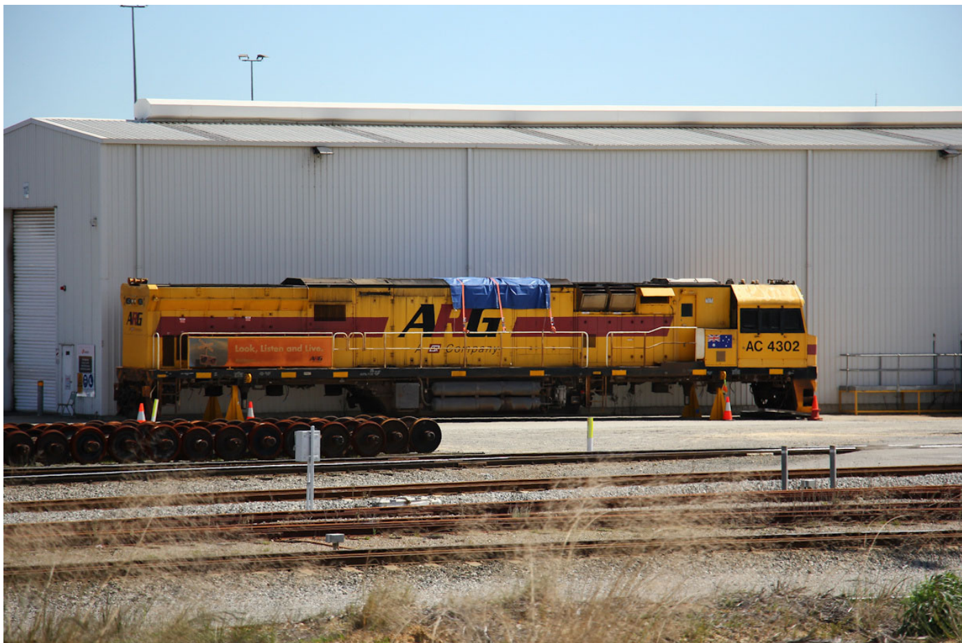
Following its road trip from Esperance, defective AC4302 remains stored at Forrestfield, 1 st September.