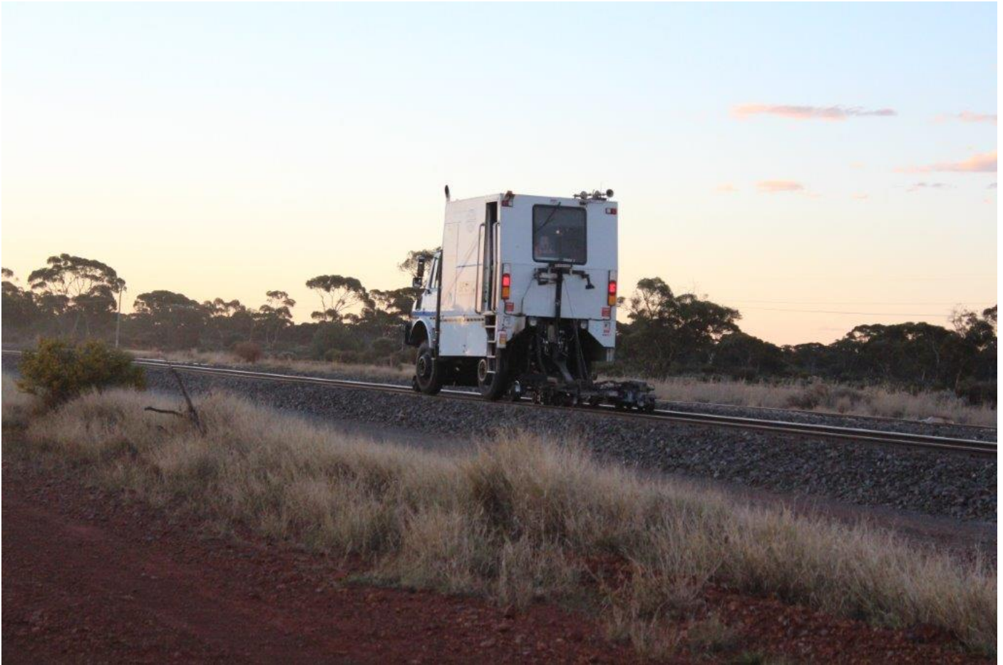
The instrumentation operator gazes out the rear of the Speno, Parkeston, 3 rd September.