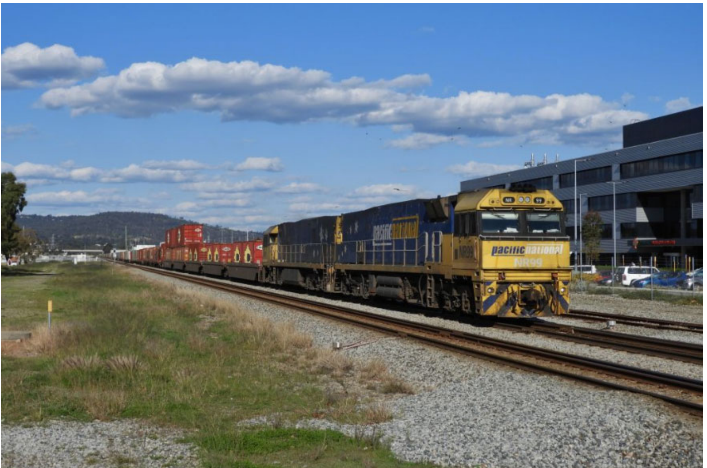
NRs 99 & 81 lead 6SP5 through Midland, 2 nd September.