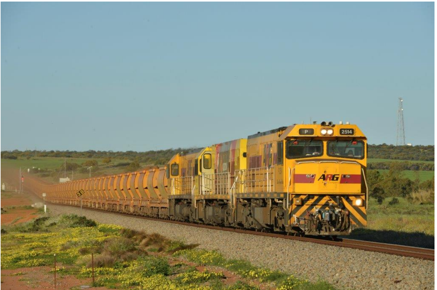
Ps 2514, 2517 & 2508 work 7725 Mt Gibson ore upgrade to Millewa, 1 st September.