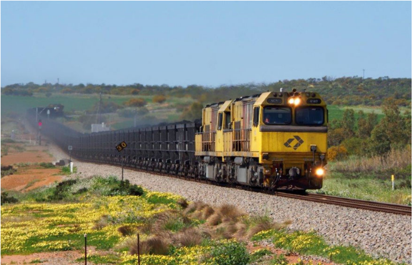
ACNs 4149 & 4152 with 4171 DPU haul 7763 Karrara ore towards Mullewa, 1 st September.