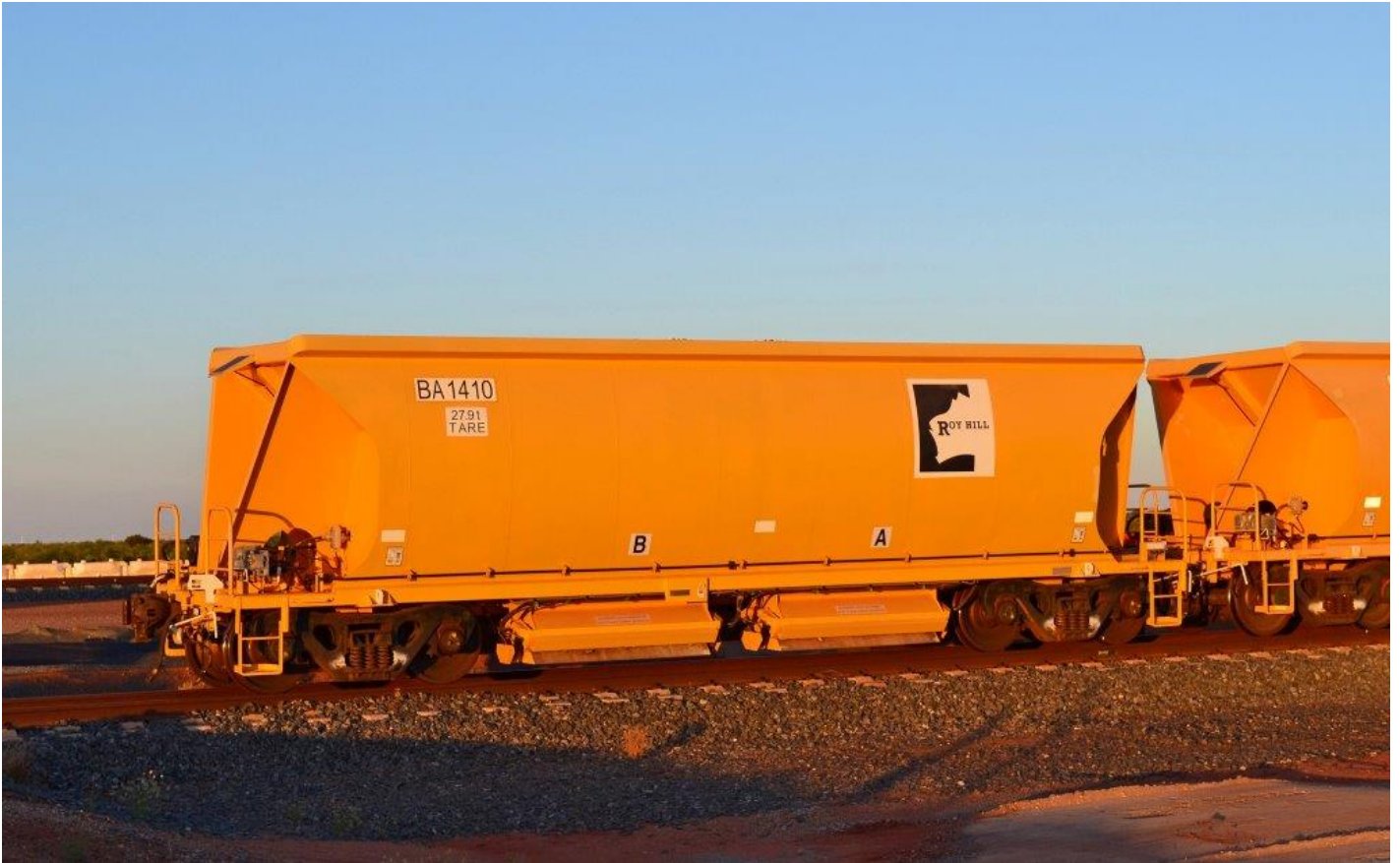
Roy Hill ballast hopper BA1410, 7 th September.