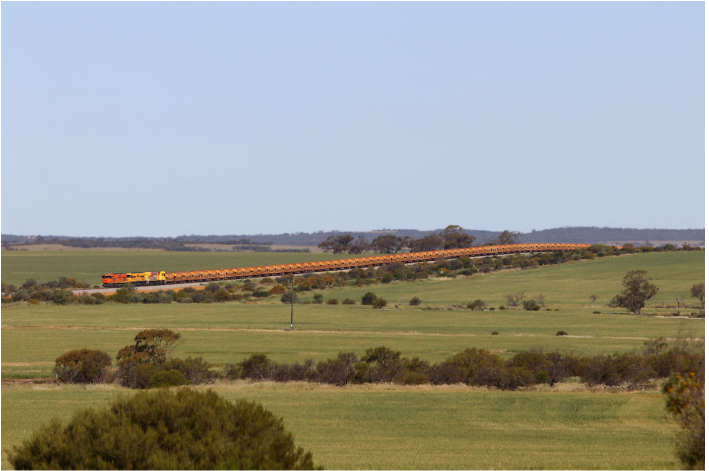
Ps 2509, 2508 & 2513 on 1725 loaded Mt Gibson ore at Tardun, 16 th September.