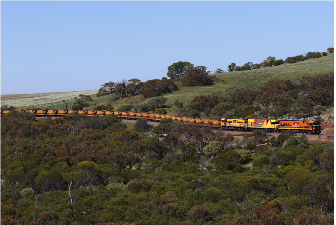
Another load of Mt Gibson ore for export through Geraldton passes through Bringoo behind Ps 2503, 2506 & 2501, 15 th September.