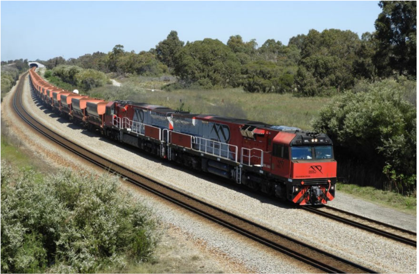
MRLs 003 & 002 haul train 1031 ore from Kwinana to Esperance through South Guildford, 16/9.