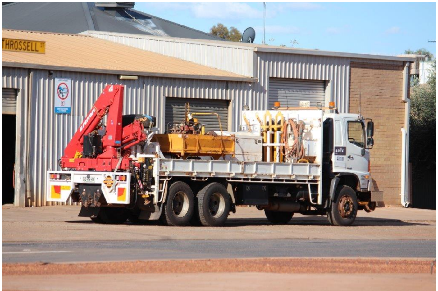
The second of ARTC Parkeston's welders' road-rail trucks, AR103, at the autoelectrician, 3 rd September.