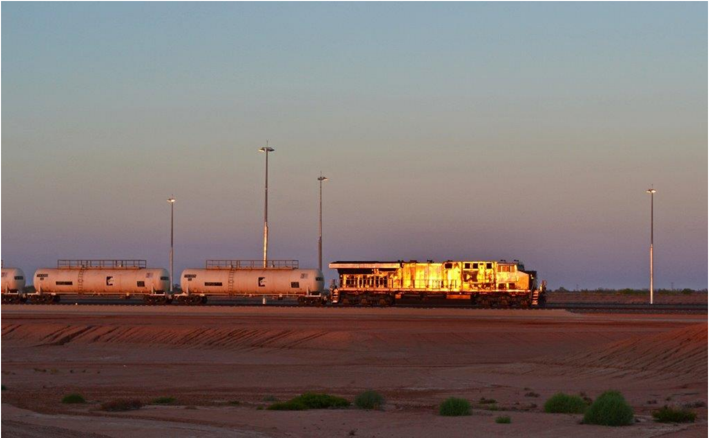
RHA1015 stands at the head of TA tank wagons on the Roy Hill fuel train at sunset, Terminal Yard, 7 th September.