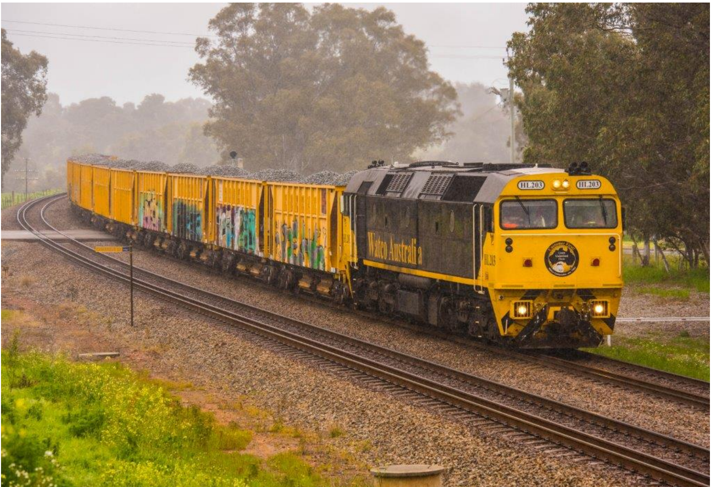
The rain is falling at Brigadoon as HL203 hauls 7BT3 to Moondyne, 8 th September.