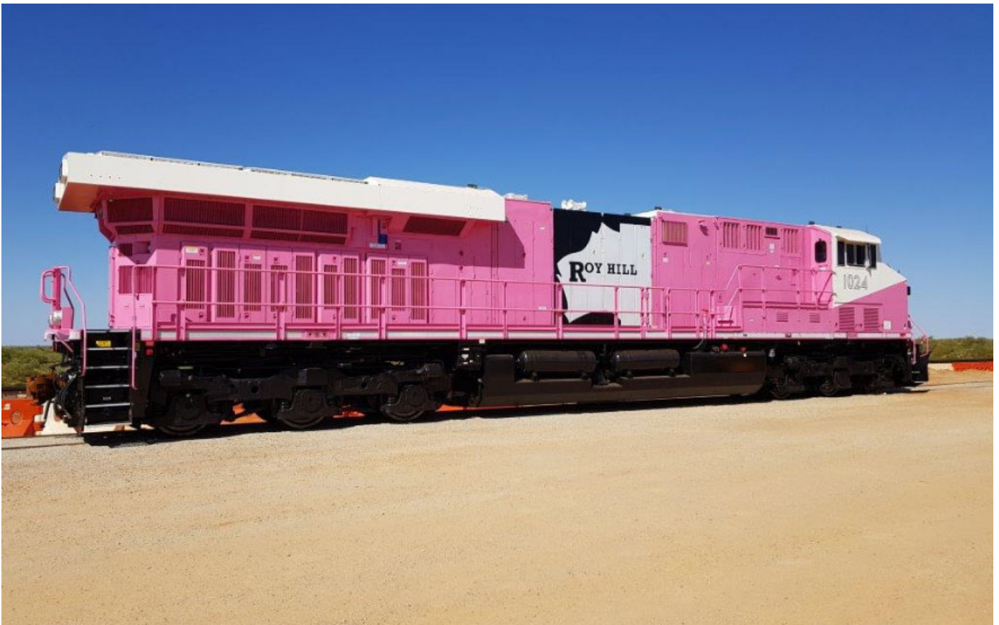
Roy Hill's new RHA1024 awaits checking and commissioning, 15 th September.