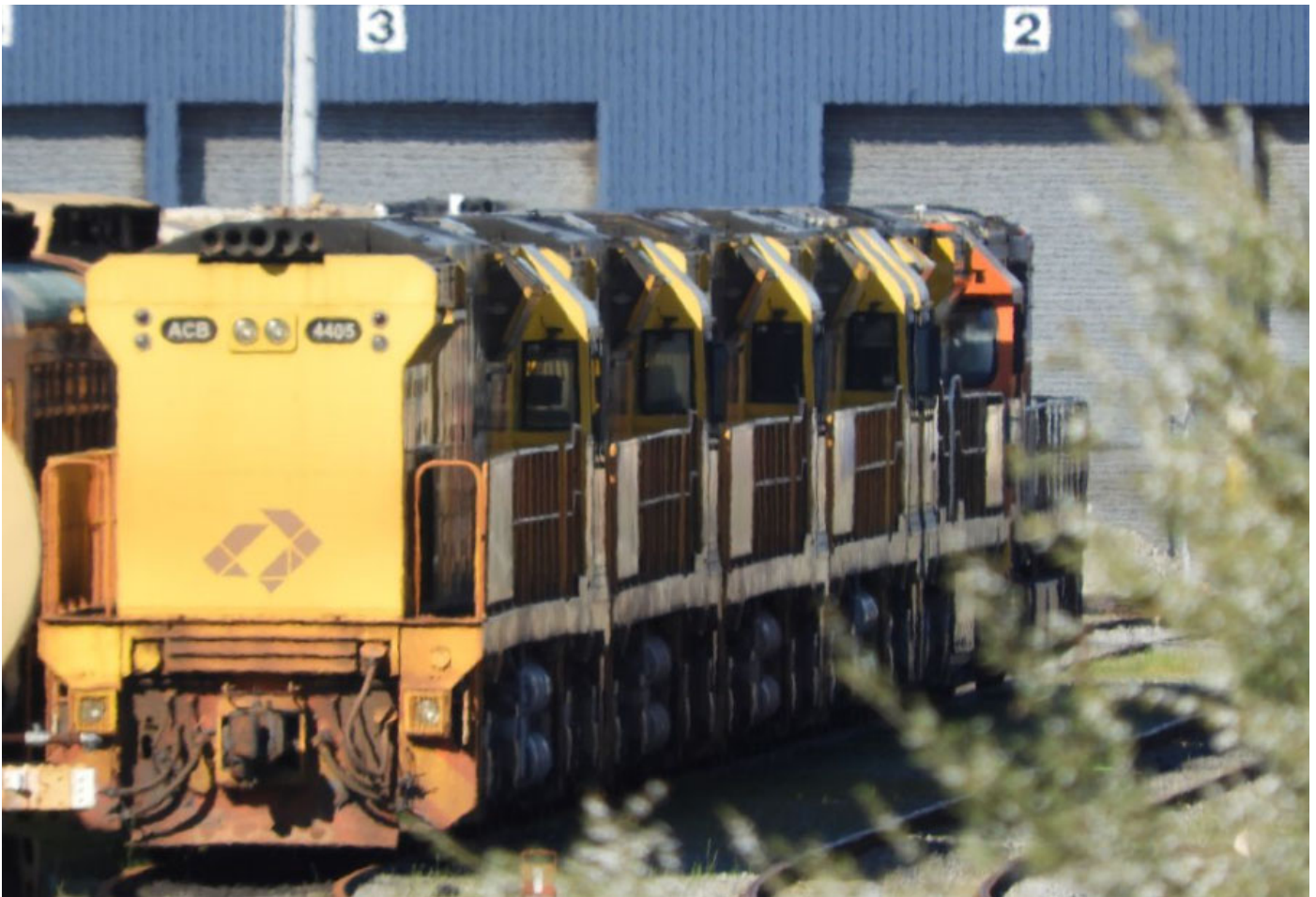
A lineup of stored GEs and an orange Q on the loco ladder, Forrestfield, 2 nd September.