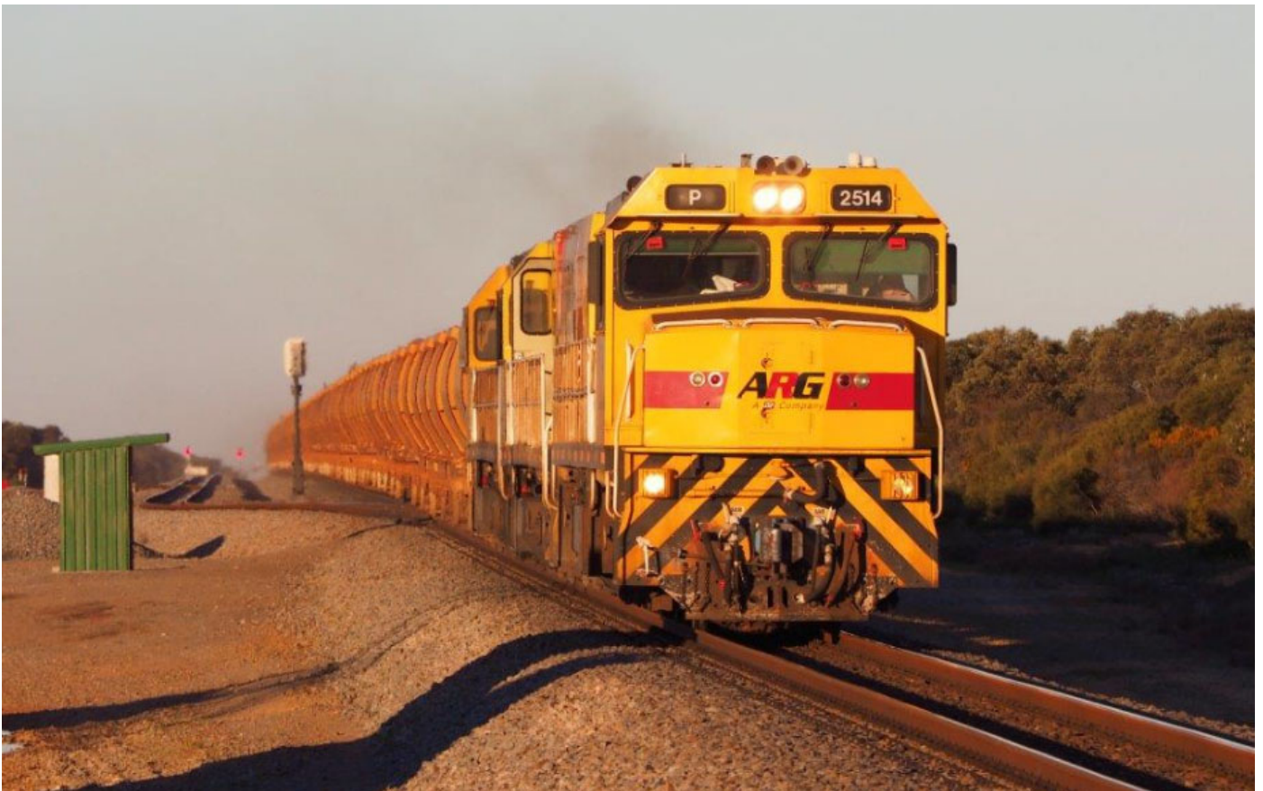
7725 Mt Gibson ore passes Nola loop with Ps 2514, 2517 & 2508, 1 st September.