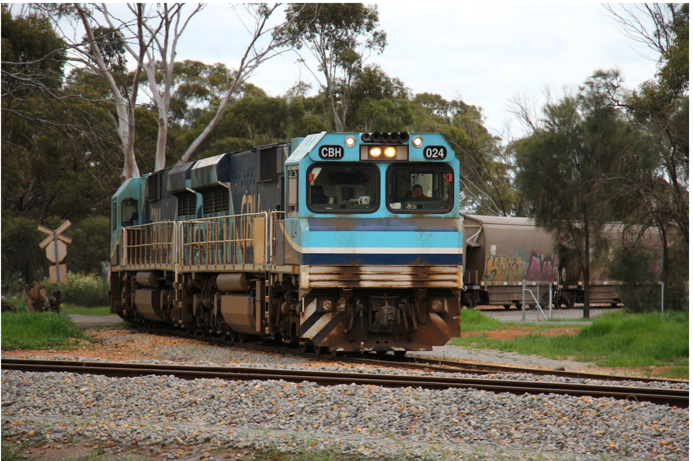
CBH024 & 025 at Moora CBH, 1 st September.