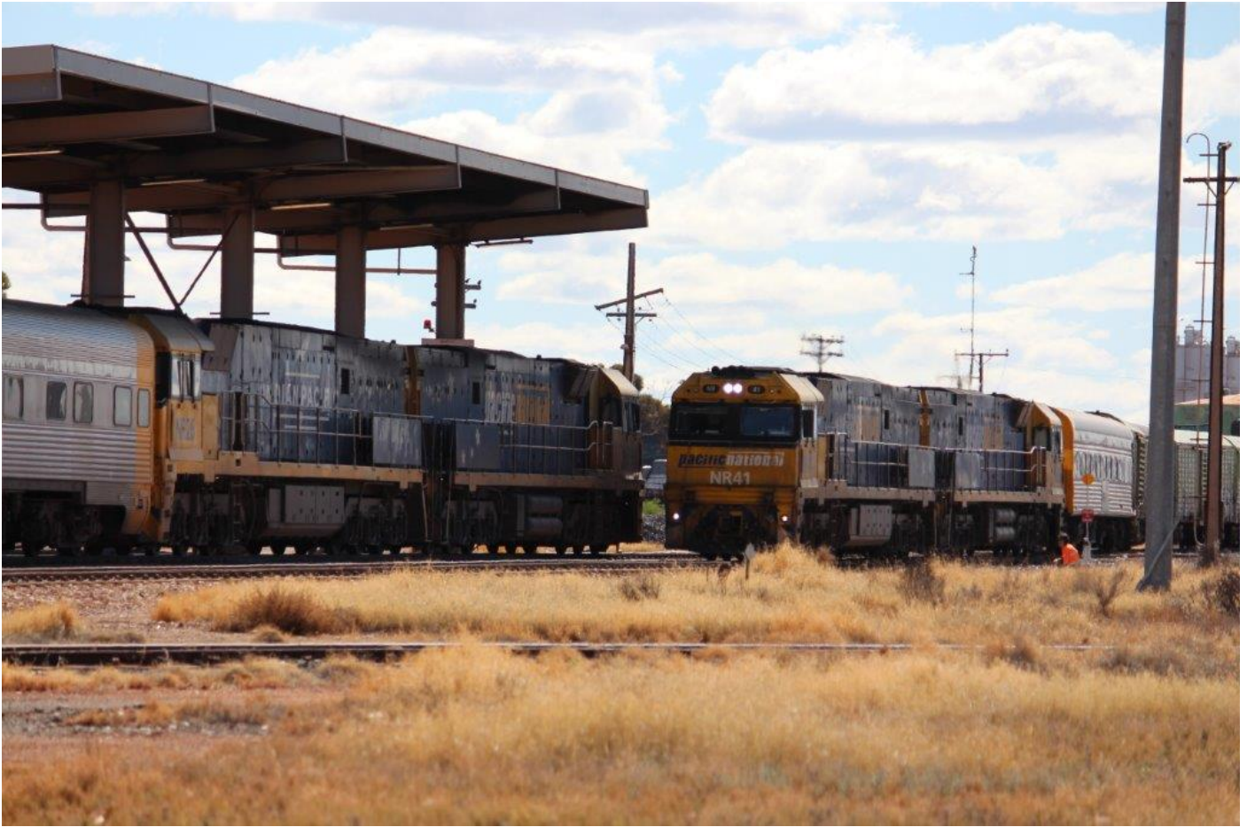
As late pair 7PM5 and 6MP4 cross at Parkeston, a crewmember watches for damage under PM5 after it had run over a dumped shopping trolley in Kalgoorlie, 2 nd September.