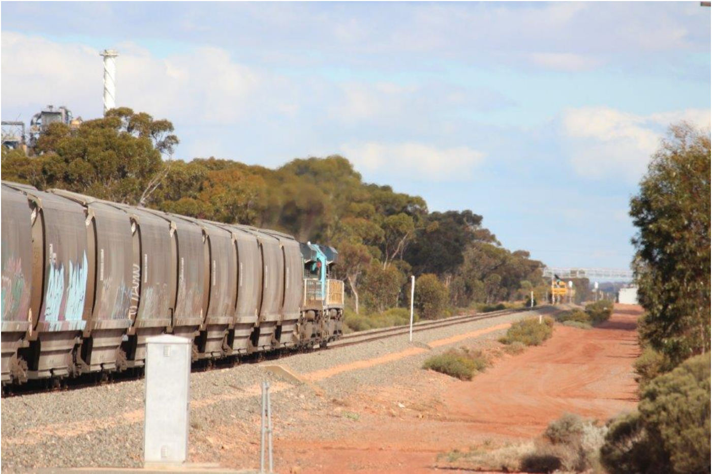
Q4016 shunts 1438 Redmine nickel at Hampton while CBHs 122 & 121 approach, 2/9.