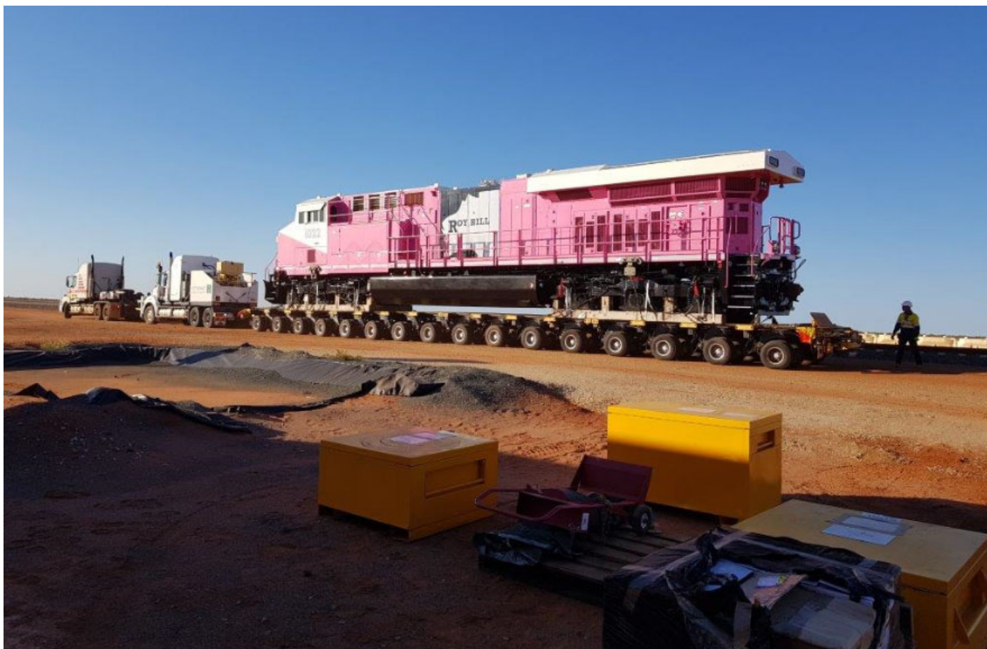
Roy Hill's new RHA1022 arrives at Flashbutt Yard for transfer to rail, 7 th September.