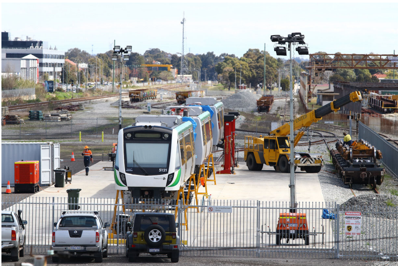
TransPerth B set #121 is united with its narrow gauge bogies at Bellevue, 1 st September.