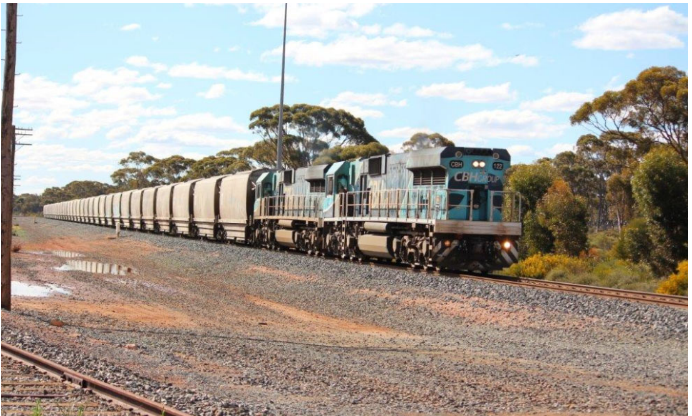
Watco recently ran their second grain program for the year between Grass Patch and Esperance. CBHs 122 & 121 lead a rake of hoppers through Hampton as 1S73 on their way to commence the three-week program, 2 nd September.