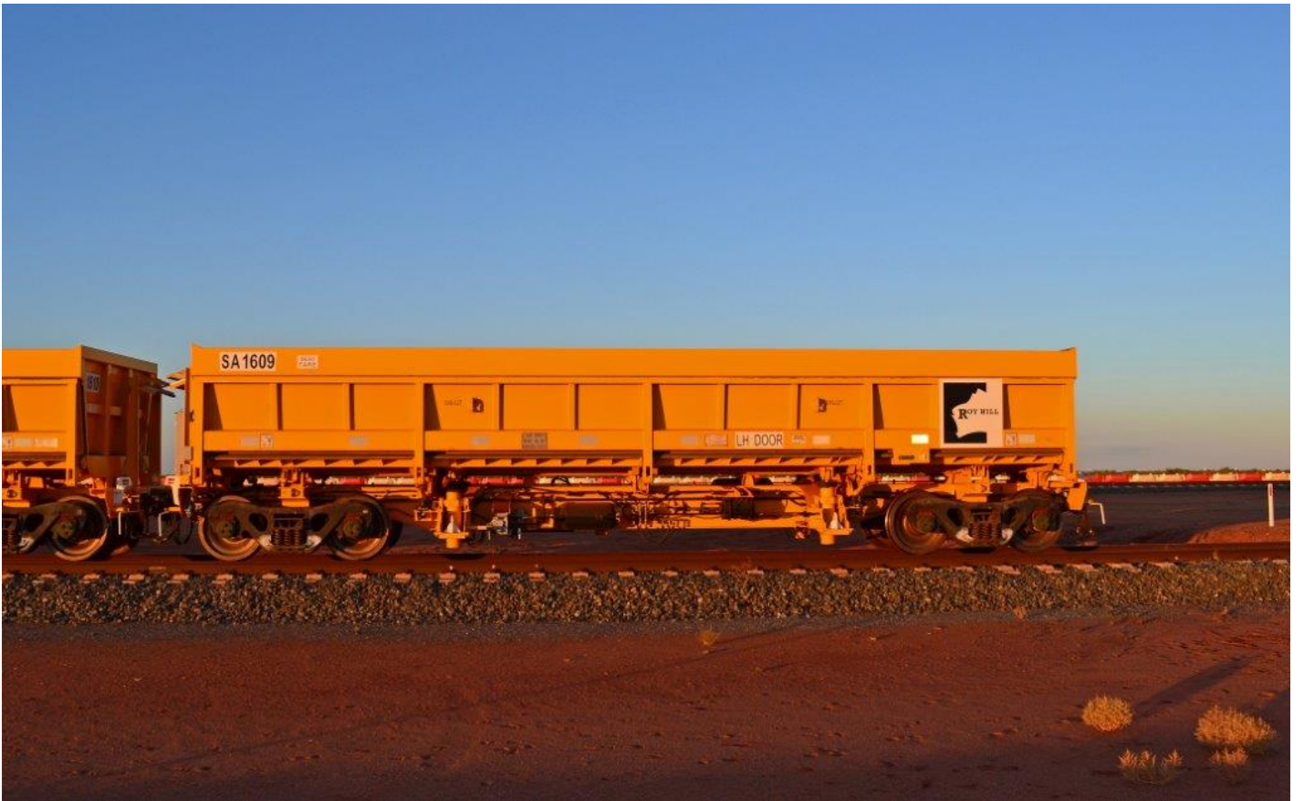
Roy Hill spoil wagon SA1609, 7 th September.