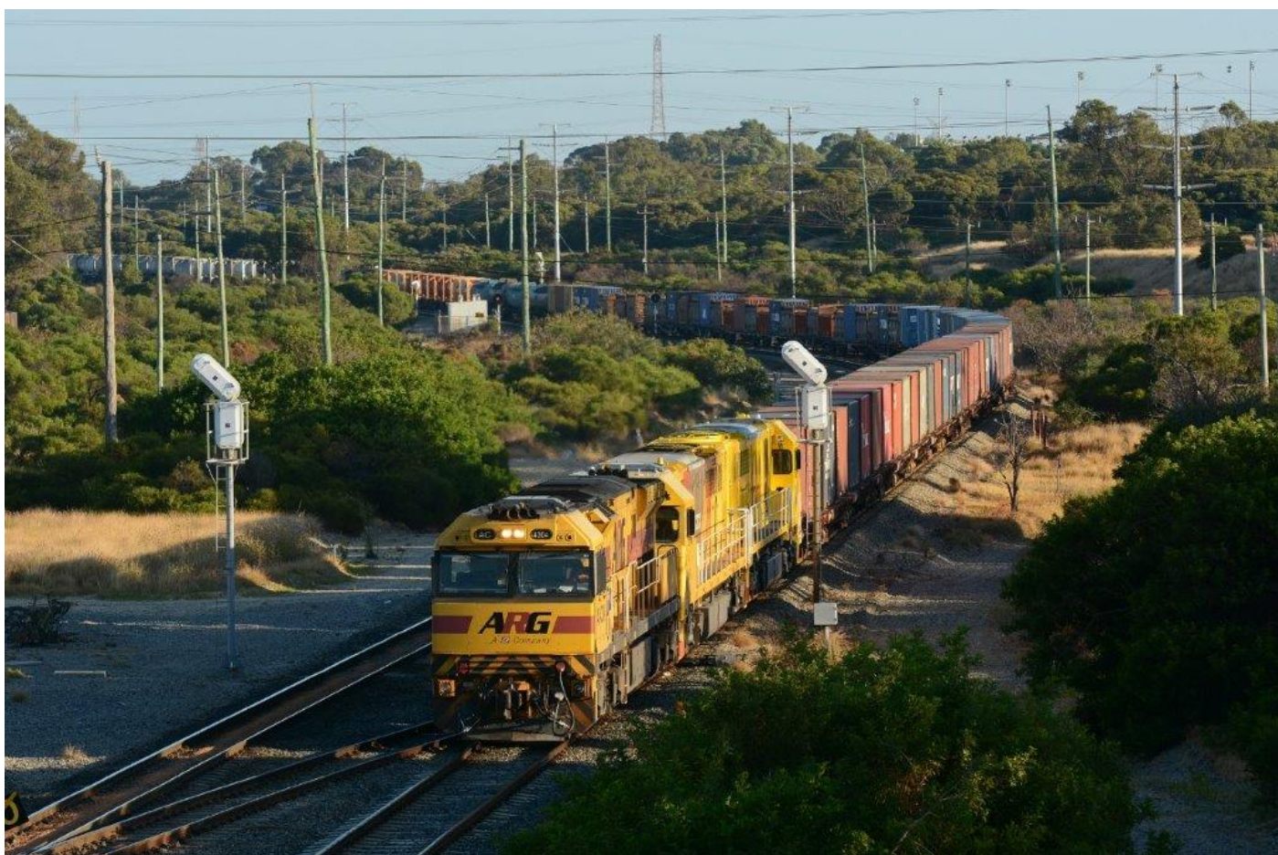
1426 approaches Kwinana behind AC4304, Q4009 & dead Q4003, 31 st December.