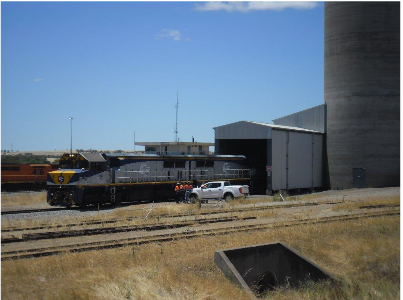
VLs 361 & 357 at Avon, 28 th December, while the crew have a break.