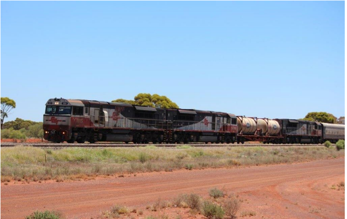
SCTs 015 & 014 haul failed SCT003 on 6PM9, Parkeston, 29 th December.