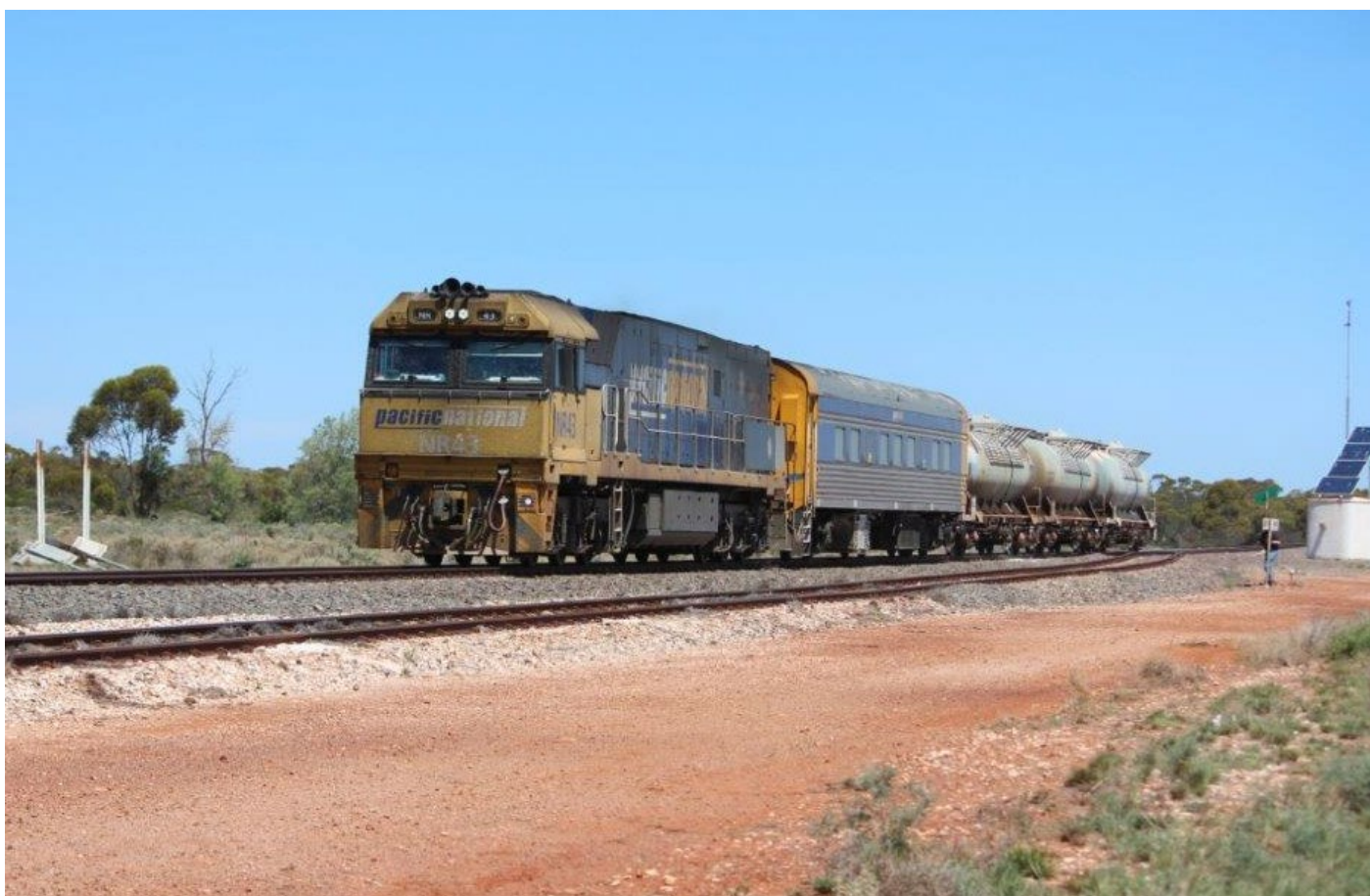
NR43 on 8831 “taxi” ferries crews and tanks from Cook, Golden Ridge, 25 th December.