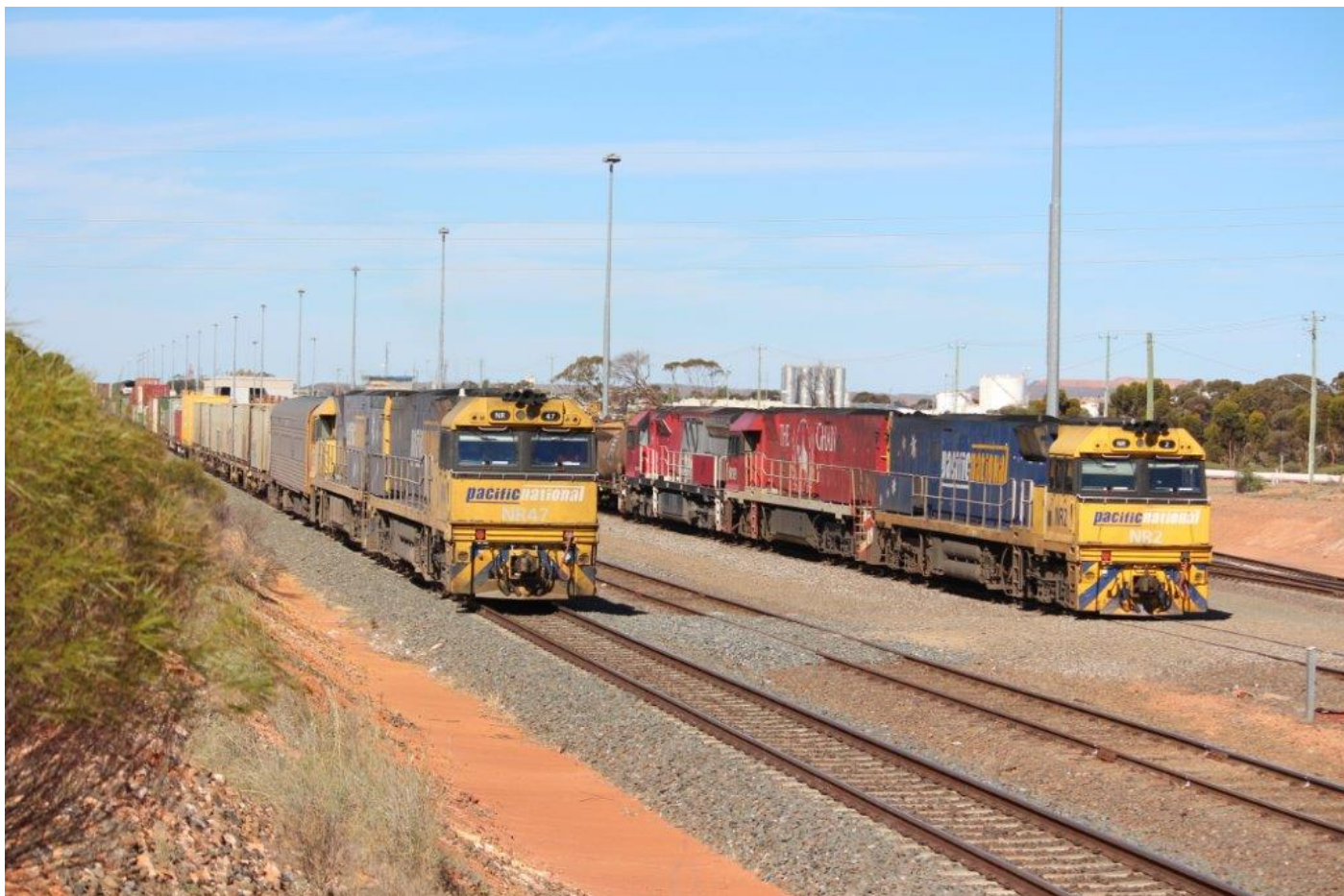
So much red! NRs 47 & 55 on 4MP5 wait beside NRs 2 & 109 with dead-attached MRL004 for transfer to Esperance on 6445 empty fuel, West Kalgoorlie yard, 21 st December.