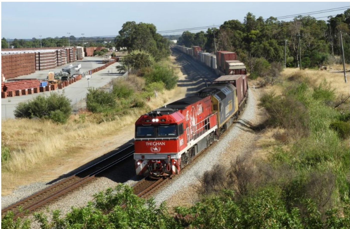
NR75 & AN11 on the final 6MP1 for 2018, South Guildford (above) and Woodbridge (below), 23 rd December. This Christmas peak extra service commenced in early October and ran weekly til late December.