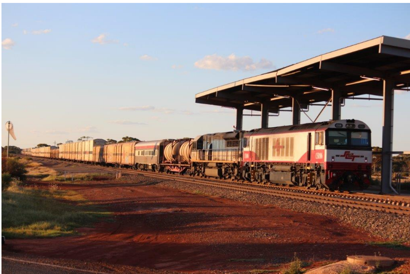
Rescue unit CSR006 assists LDP002 on 5PM9, Parkeston, 28 th December.