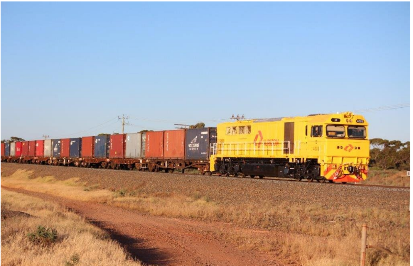
Q4003 failed just out of Kalgoorlie on 1479 to Leonora around 0200 on 30 th December; Q4009 was sent out light engine to haul the entire train back to West Kalgoorlie, arriving soon after sunrise.