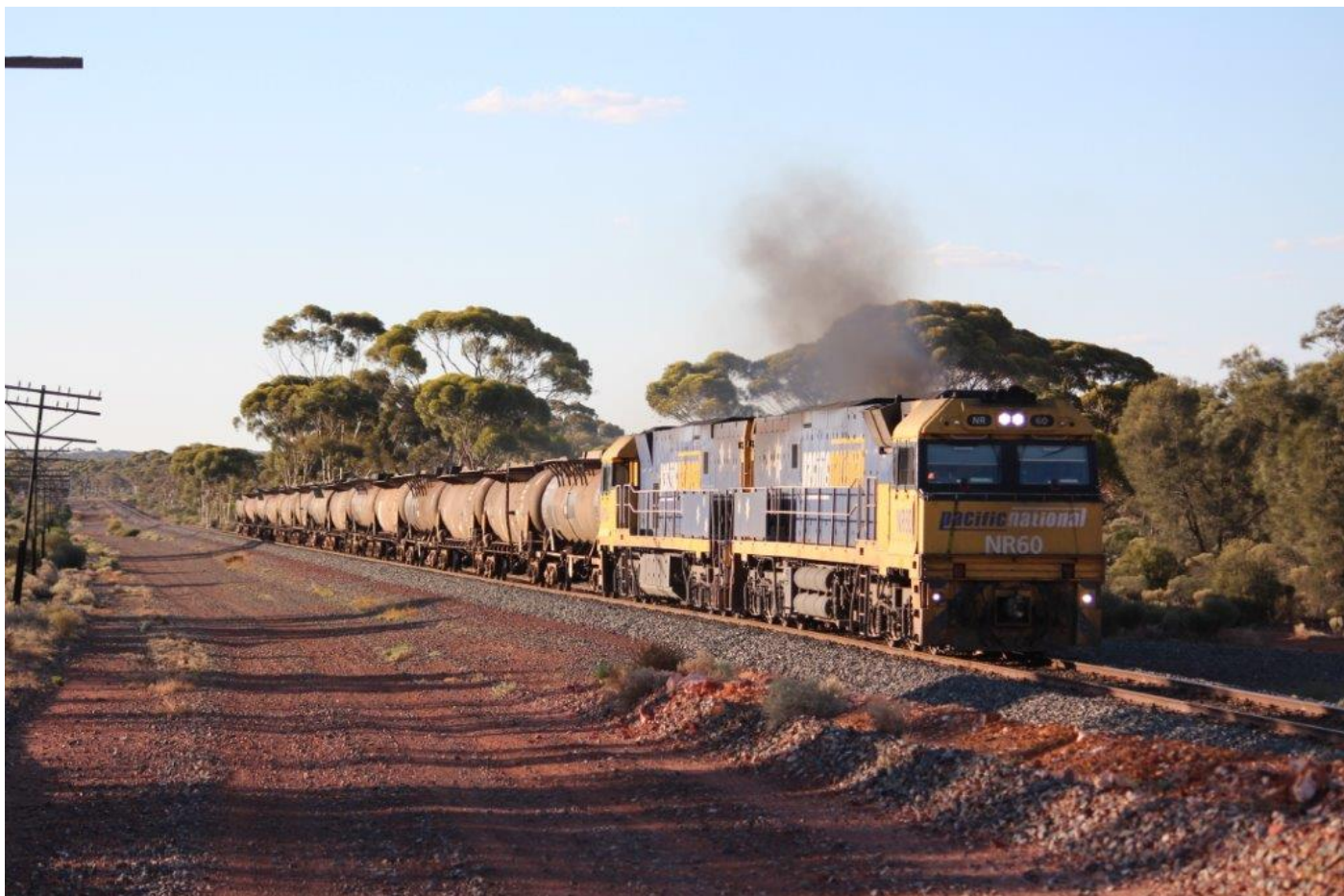
NRs 60 & 104 rattle towards Esperance with 6445 empty fuel, 11km peg, 28 th December.