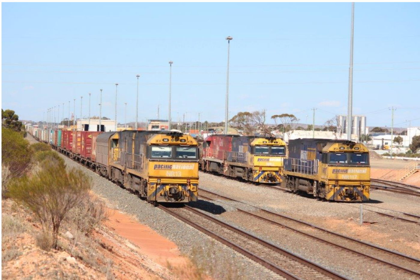
NR117 ex ore duties is removed from NRs 2 & NR109 on 2445 fuel as NRs 13 & 63 stand by on 7SP5, 24 th December.