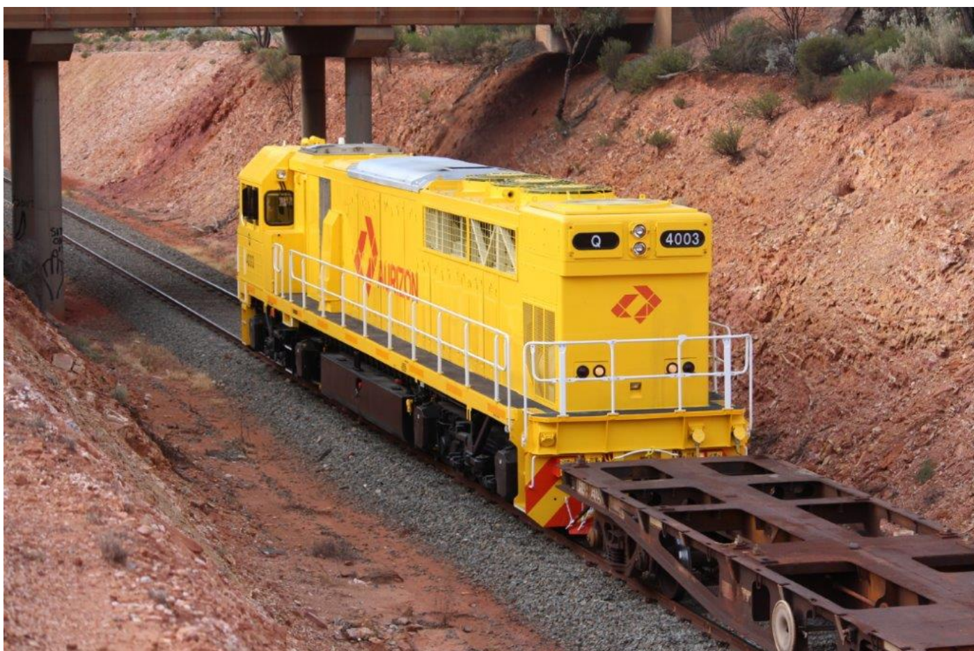
The rear view of Q4003 passing under the Great Eastern Highway, Binduli, 23/12.