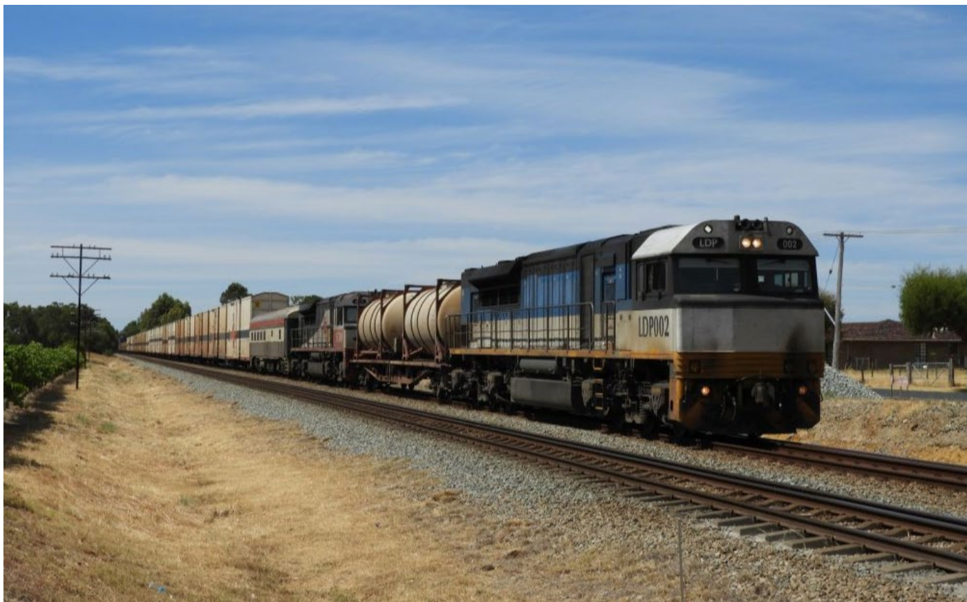
SCT003 failed just west of Cook whilst leading 2MP9, LDP002 was placed on the front at Reid. The fuel tank was positioned between the locos due to issues with hose length; the LDP was turned at Rawlinna. The train is seen here around twelve hours late at Herne Hill, 27 th December.