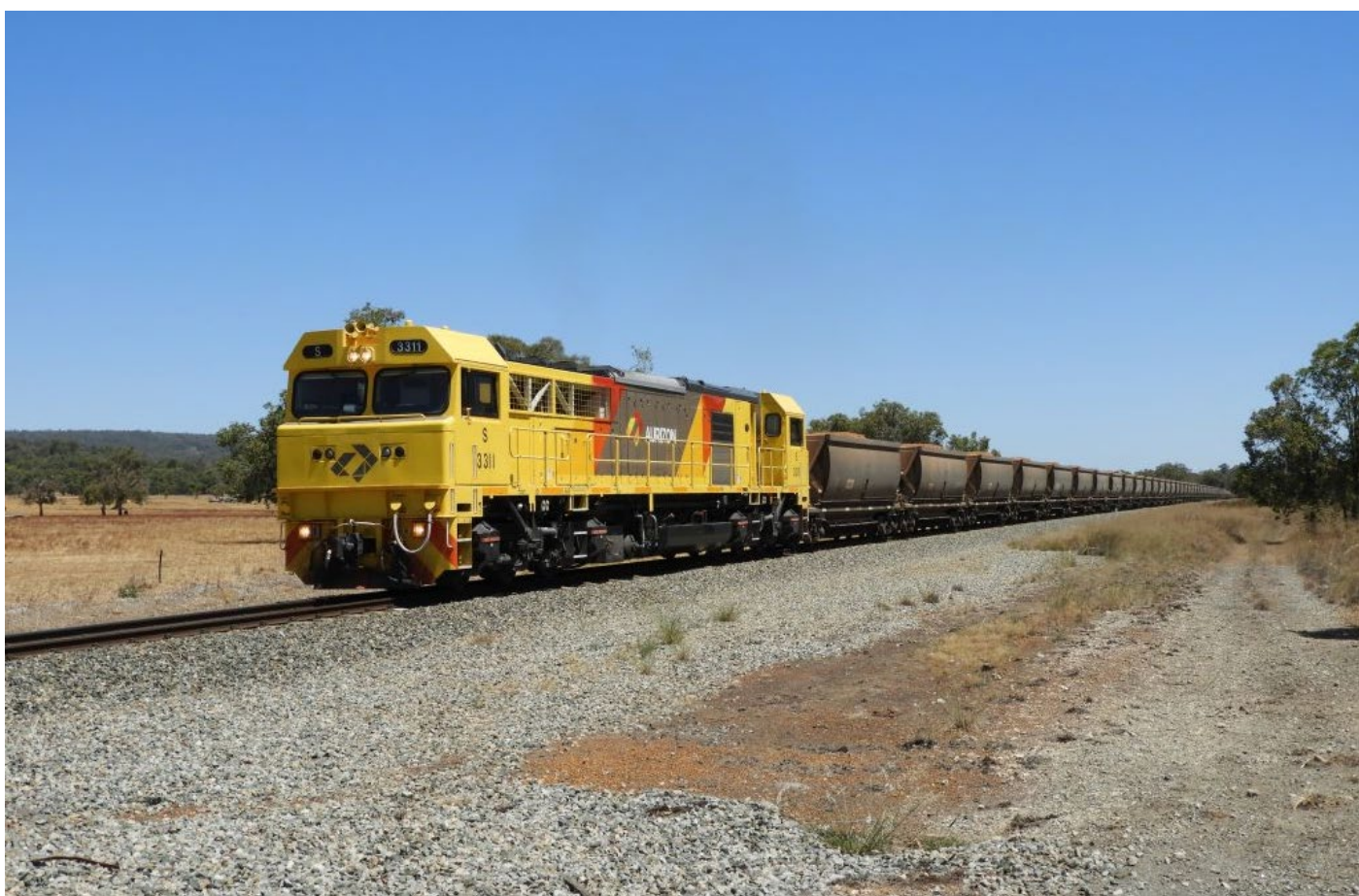
S3311 runs 2970 bauxite through Keysbrook, 24 th December.