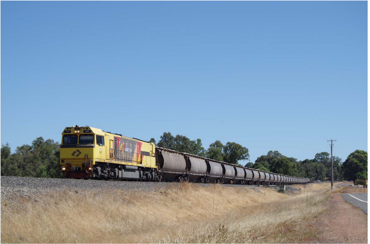
6866 races through Roelands behind ACN4147, 21 st December.