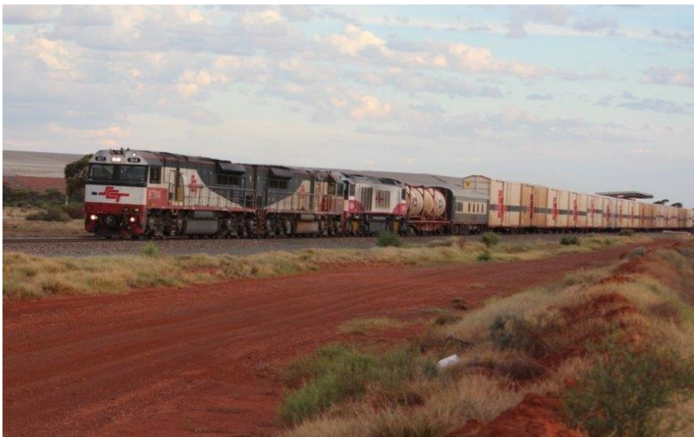
SCTs 014 & 015 haul CSR006 on 4AP9 through Parkeston, 27 th December. The CSR was added in Adelaide to replace failed SCT003 on 5PM9; originally to be removed at Parkeston, it was taken to Perth.