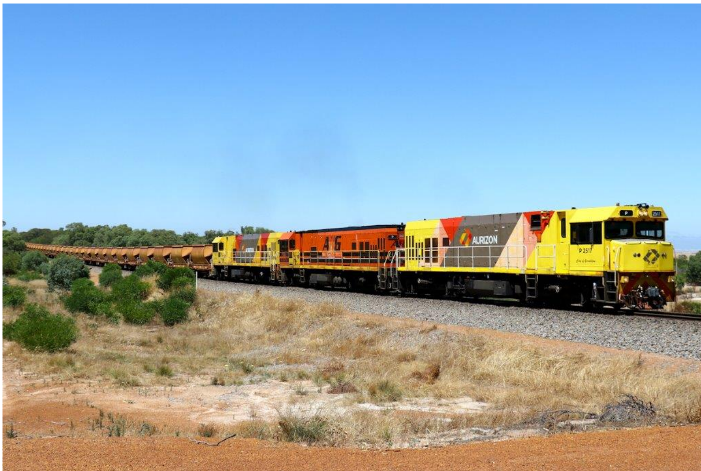
Ps 2517, 2503 & 2513 at Bringo with empty Mt Gibson 2720, 31 st December.