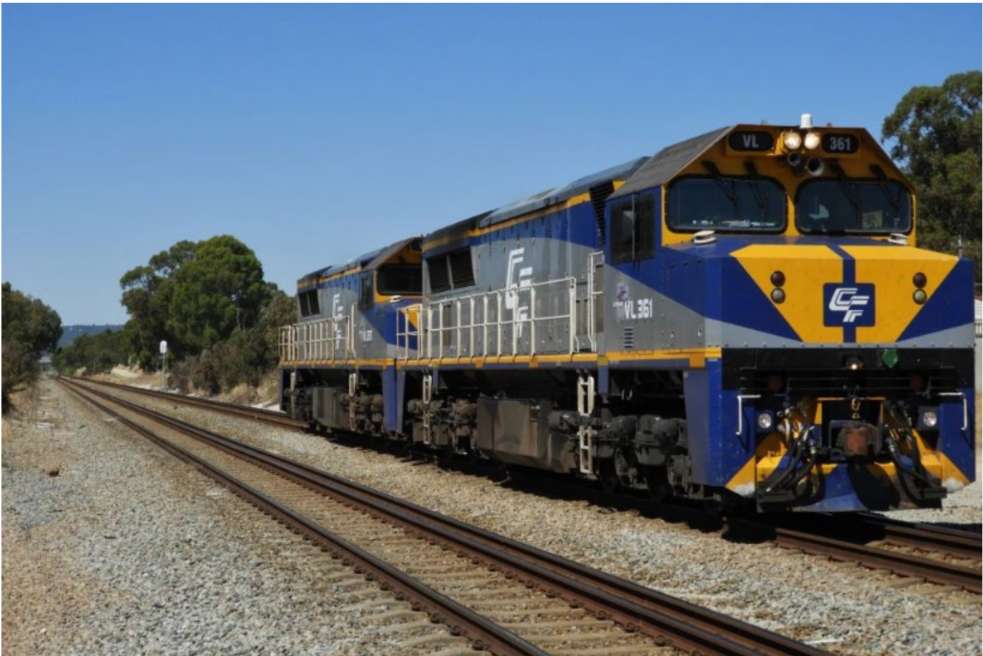
VLs 361 & 356 on 5552 light engine to CBH Kwinana, Thornlie, 21 st December.