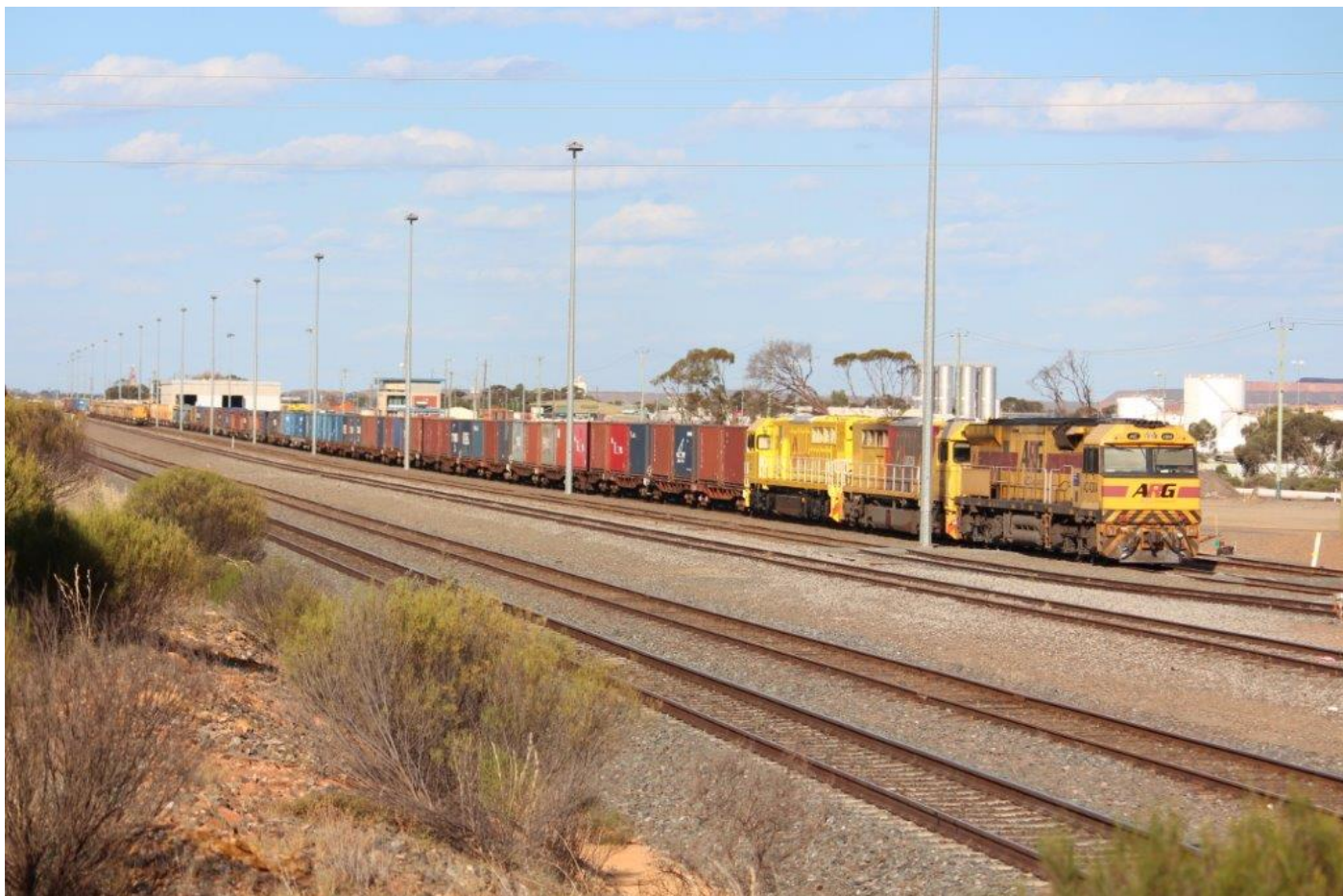
AC4304 & Q4009 with failed Q4003 dead attached on 1426 to Perth, 30 th December.