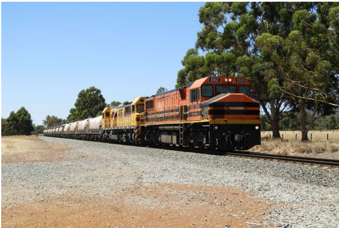
DBZ2310 leads S3309 on 2271 lime through Keysbrook, 24 th December.