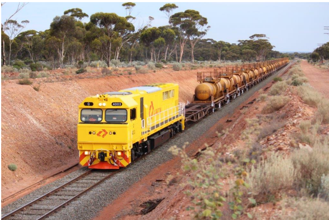
Q4003 shows off its plain new colours on 1410 acid ex Hampton, Binduli, 23 rd December.