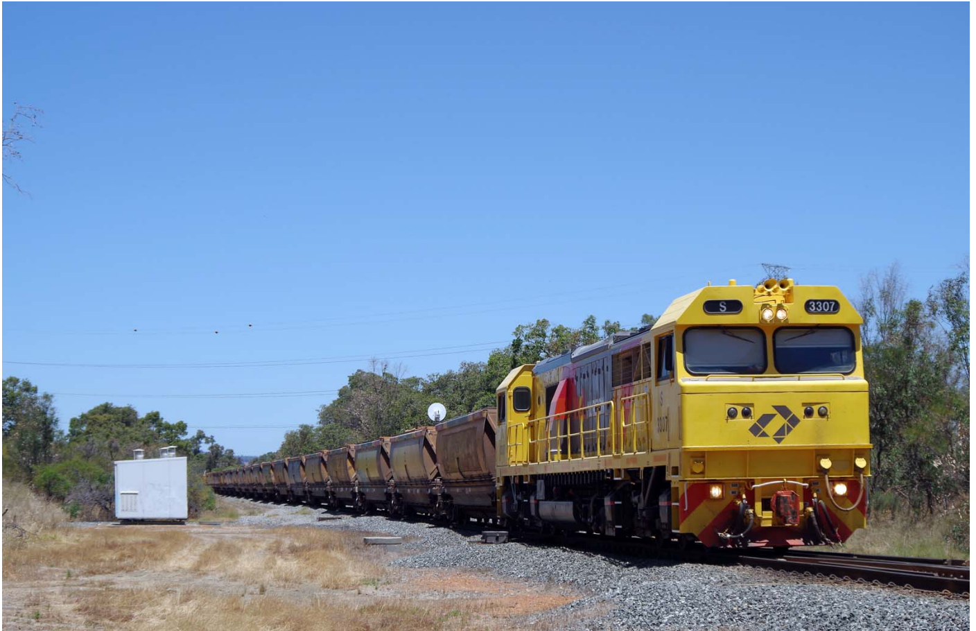
S3307 has 9760 under control at Alumina Junction, 21 st December.