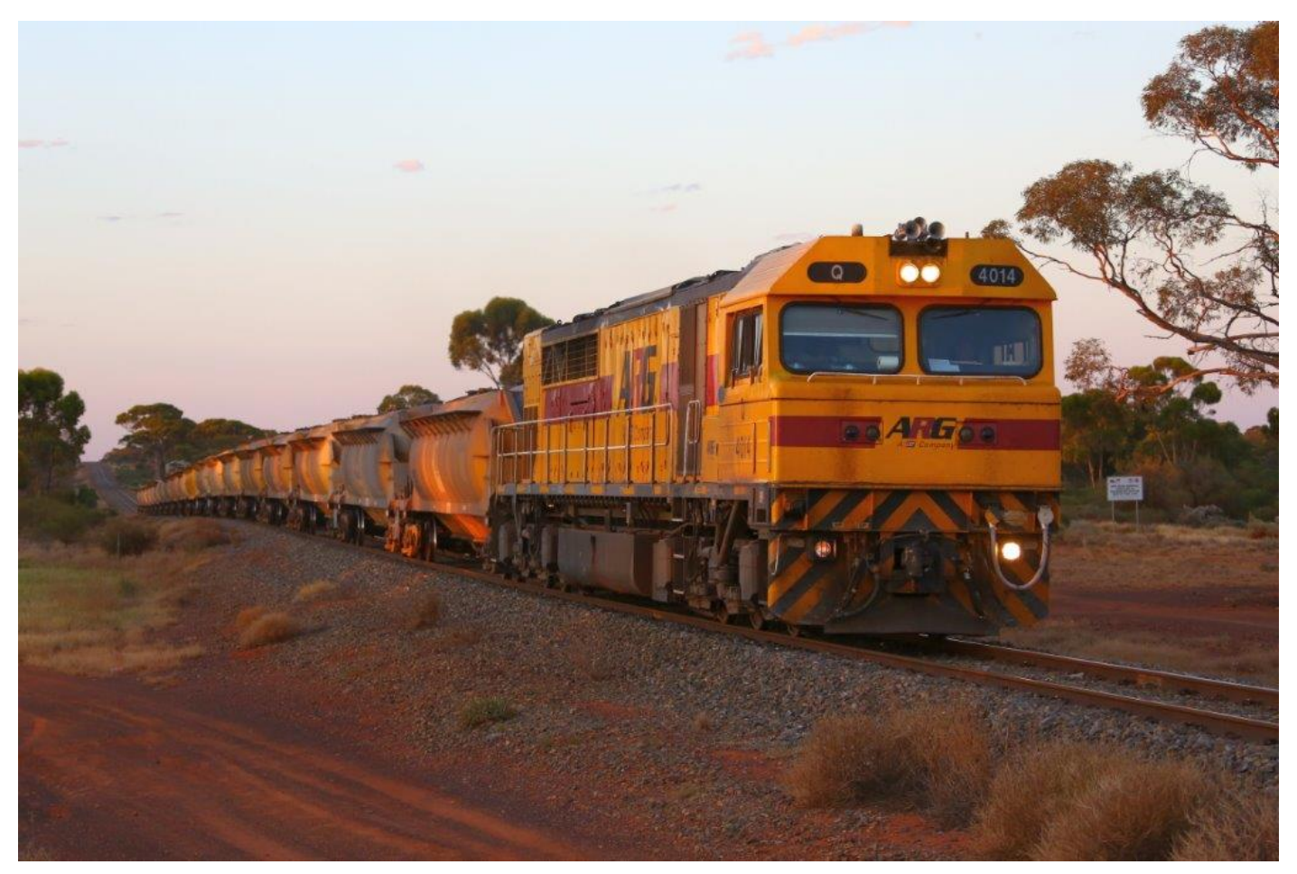
Q4014 brings 478 in from the Leonora line, 7^{\text{th}} January.