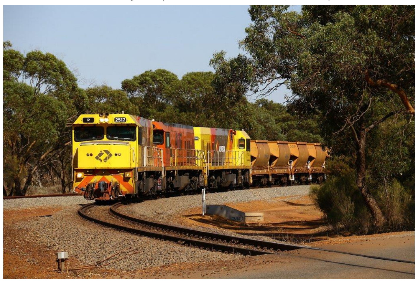
2724 empty Mt Gibson ore arrives at Perenjori behind Ps 2517, 2509 & 2506, 14<sup>th</sup> January.