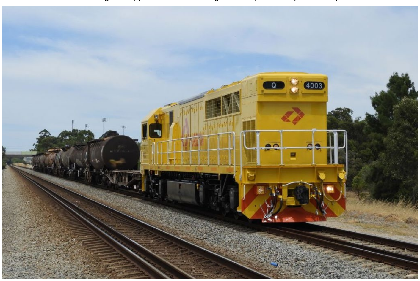
Q4003 works 3157 fuel shunt, conveying empty fuel tank wagons to Forrestfield through Thornlie, 8^{th} January.