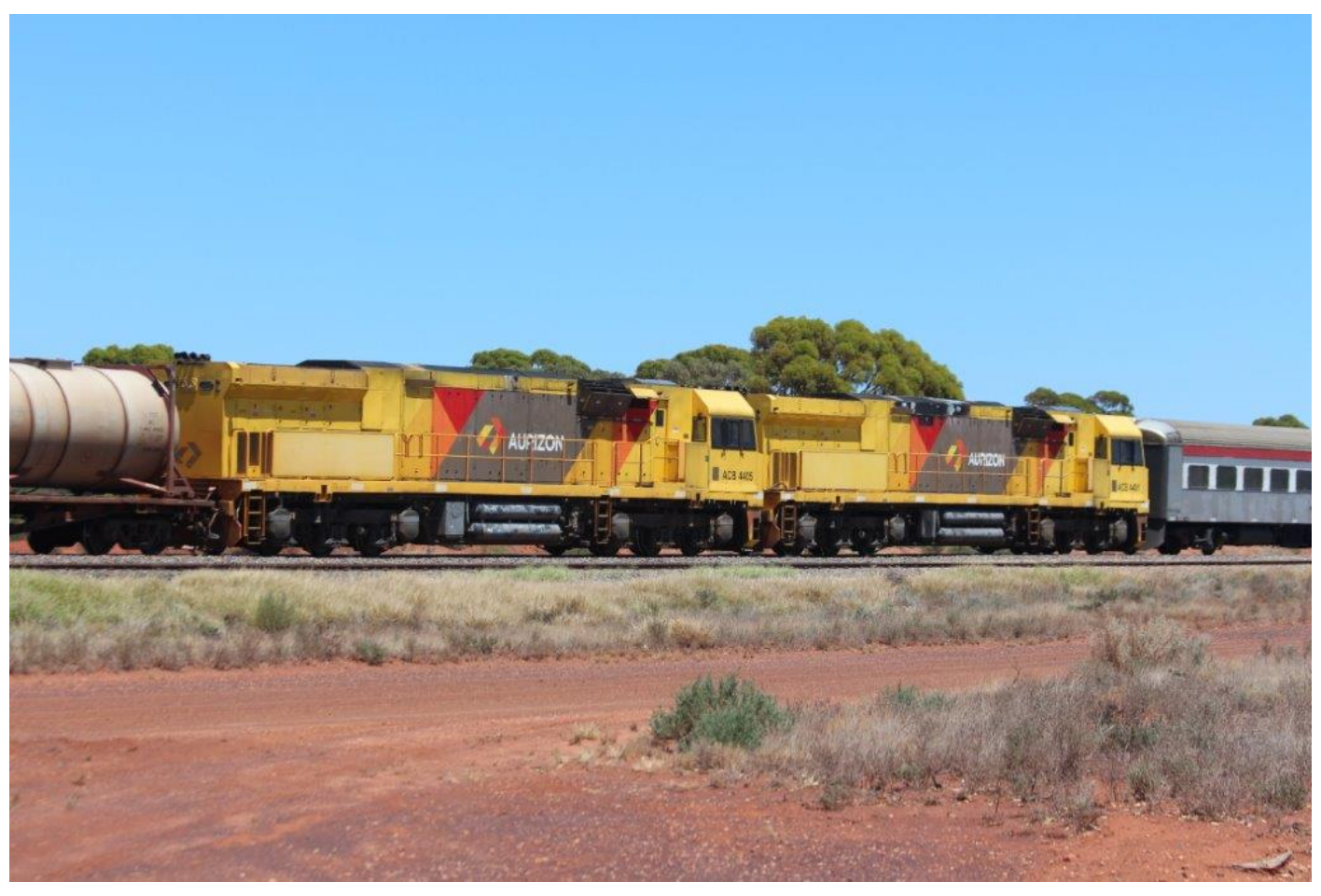
ACBs 4405 & 4401 (with charred hood) on 5PM9, Parkeston, 11<sup>th</sup> January.