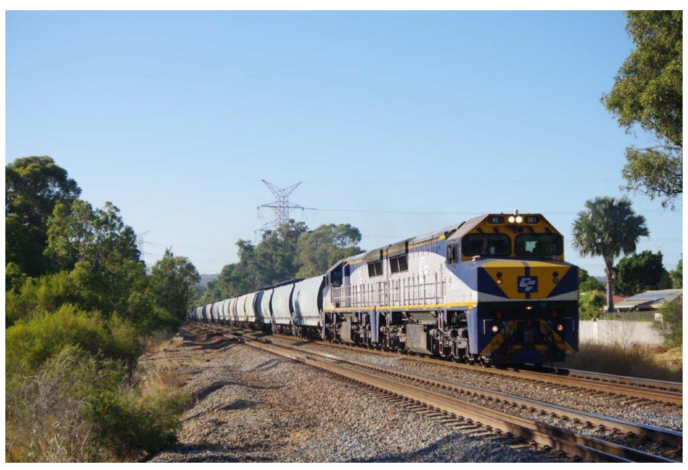
VLs 361 & 357 lead 3K03 (NSW grain rake) through Swan View, 15<sup>th</sup> January.