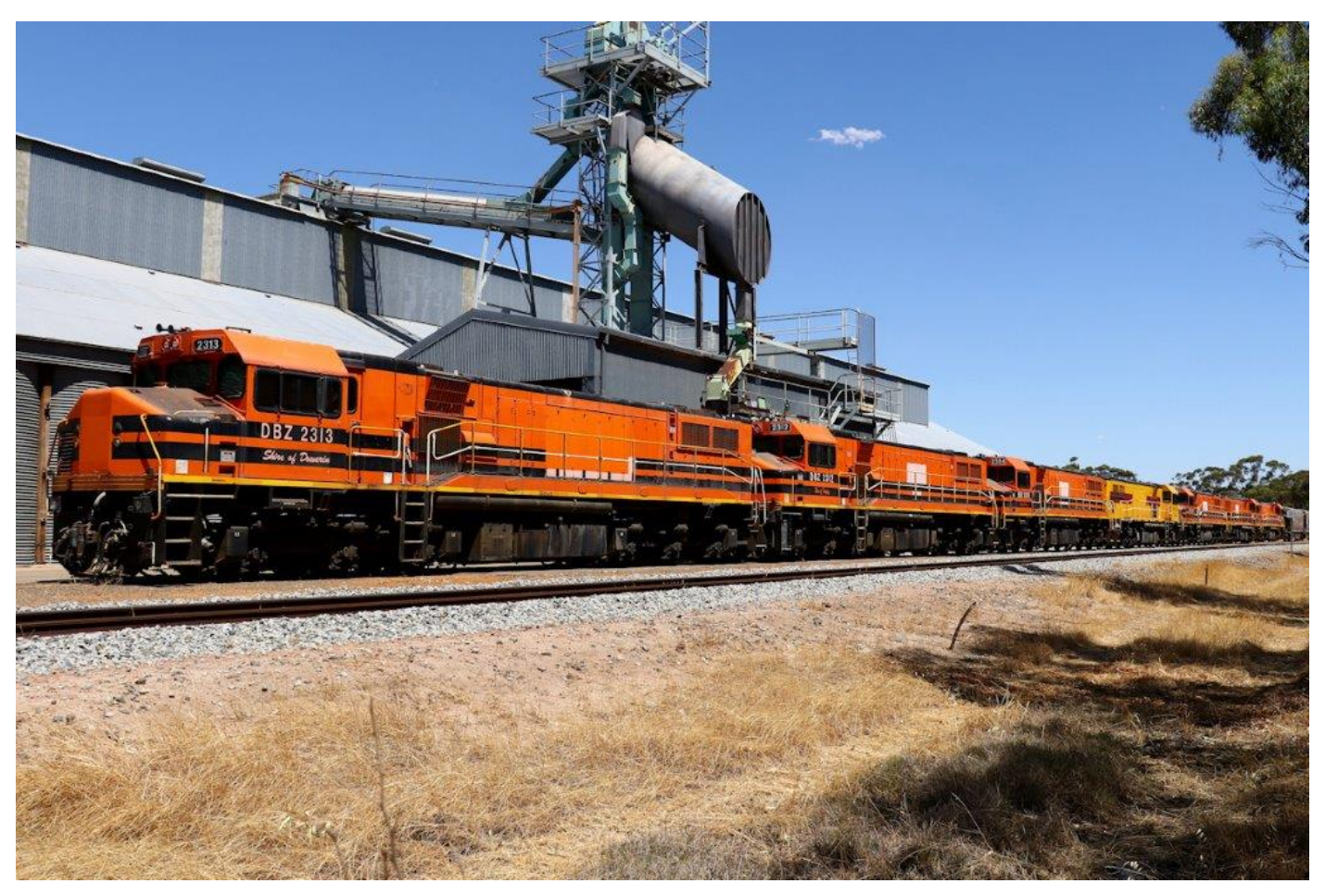
DBZs 2313, 12, 04, 07, 06, 03 & 08 stored at Beverley, 7^{th} January.