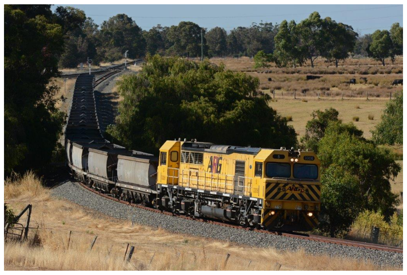
S3306 heads 5253 through Brunswick Junction, 17^{\text{th}} January.