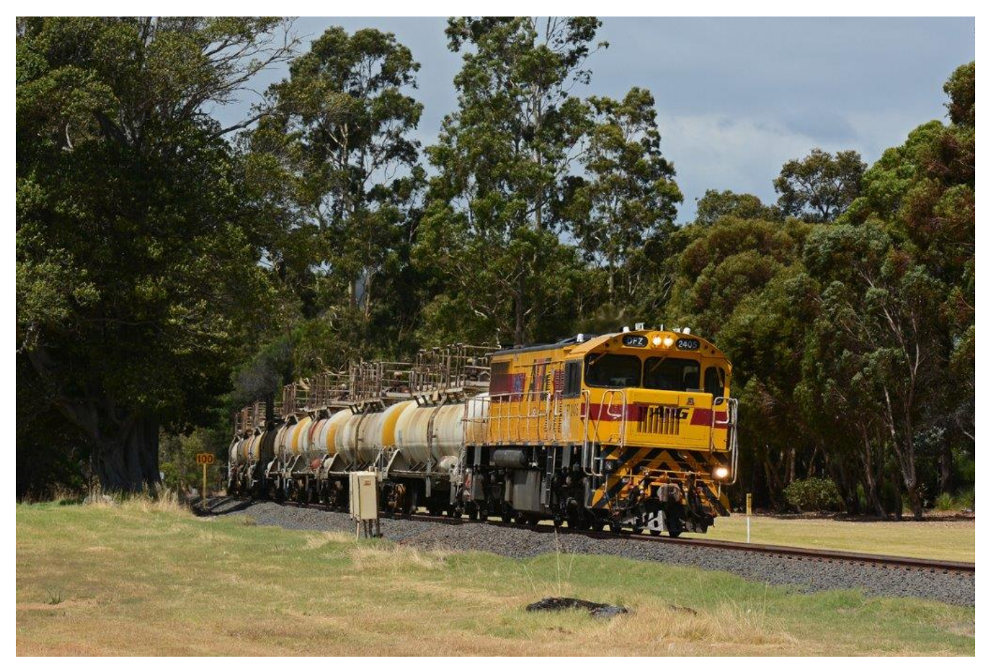
DFZ2405 runs 5903 through Burekup, 17^{th} January.