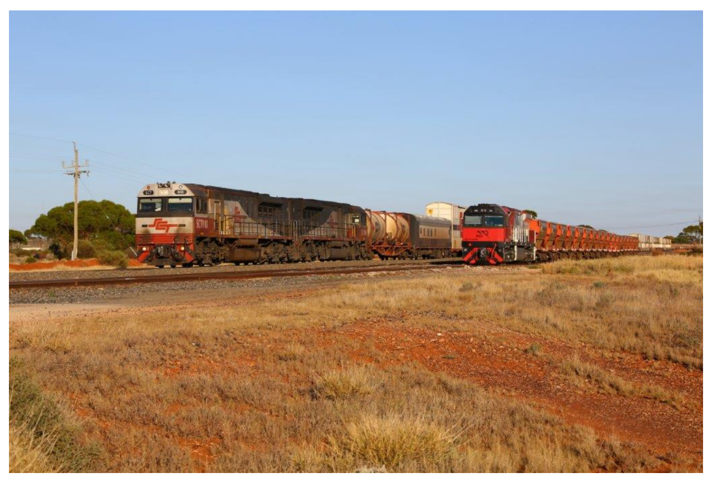
SCTs 010 & 008 lead 1PM9 past stabled MRL002 at Parkeston, 7<sup>th</sup> January.