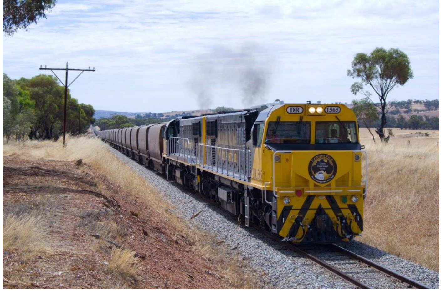
3K03 empty grain passes through Burges, powered by DRs 1565 & 1564, 8^{\text{th}} January.