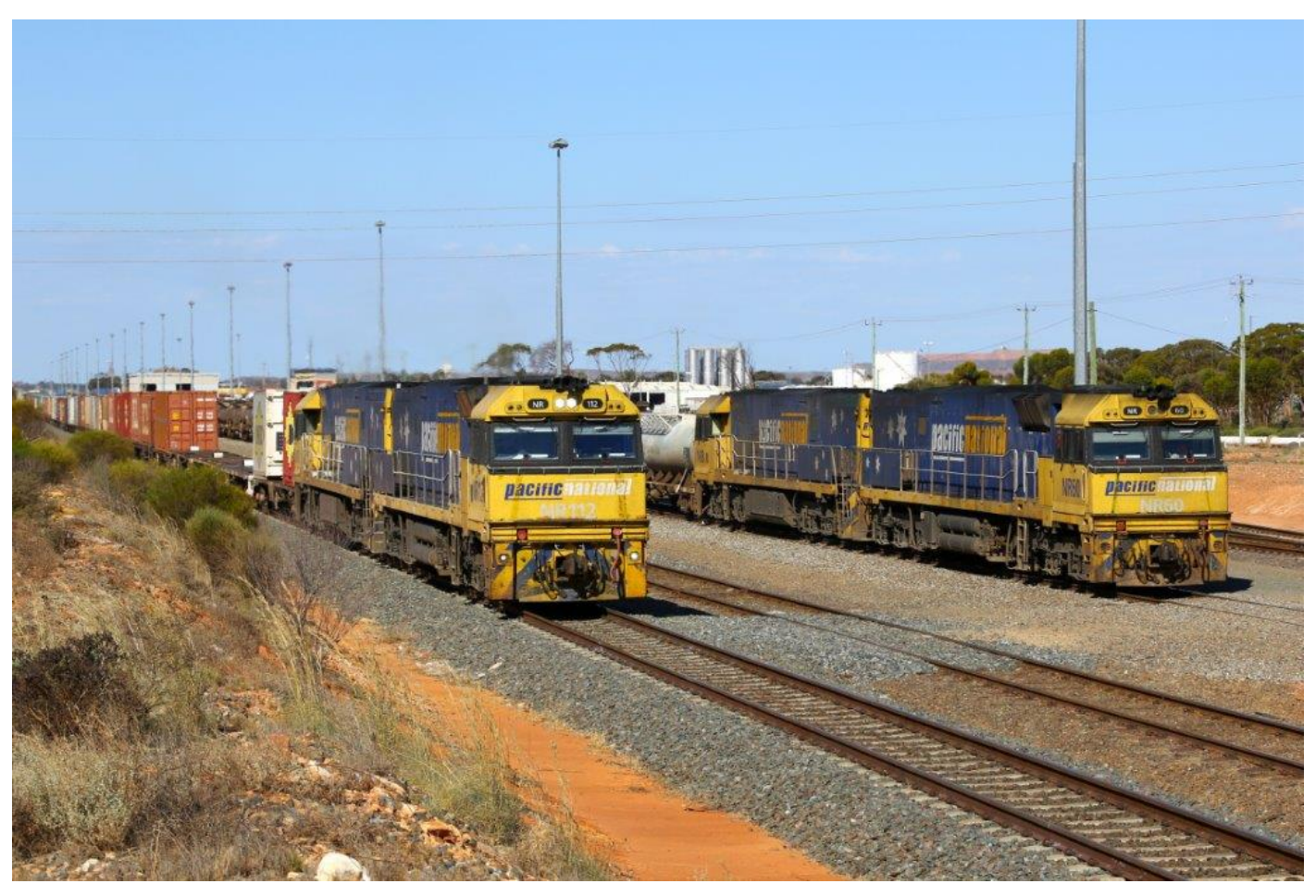
NRs 112 & 110 depart West Kal with 2SP7 as NRs 60 & 8 wait on 4445 empty fuel, 9<sup>th</sup> January.