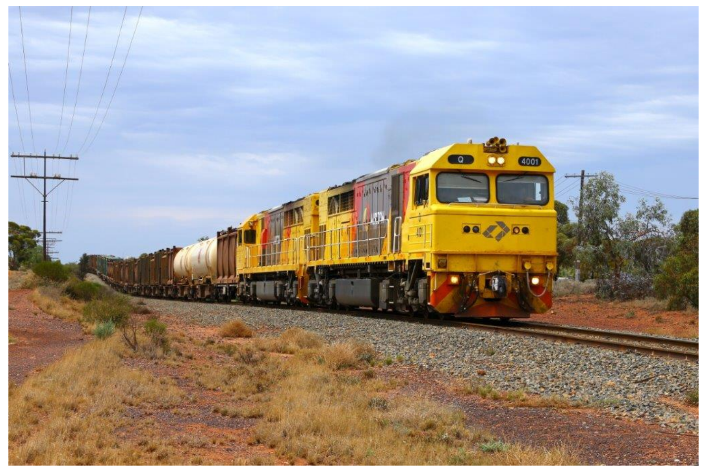
Qs 4001 & 4011 lead 3029 to Malcolm away from Kalgoorlie, 585m, 2665t, 9<sup>th</sup> January.