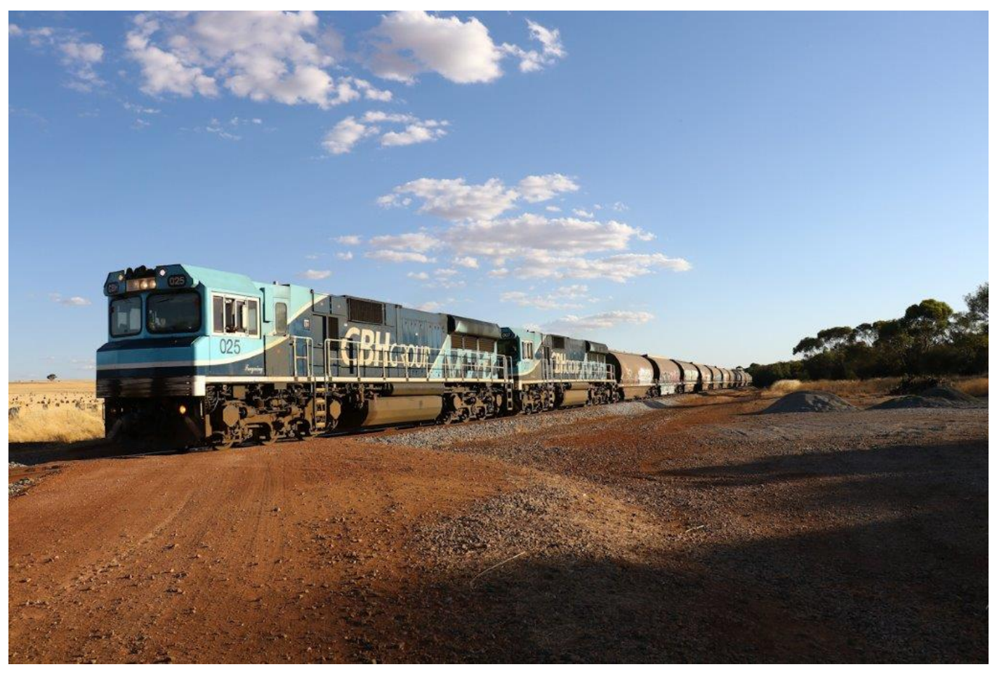
CBHs 025 & 007 lead 4K23 empty grain at Noggojerring, 9^{\text{th}} January.