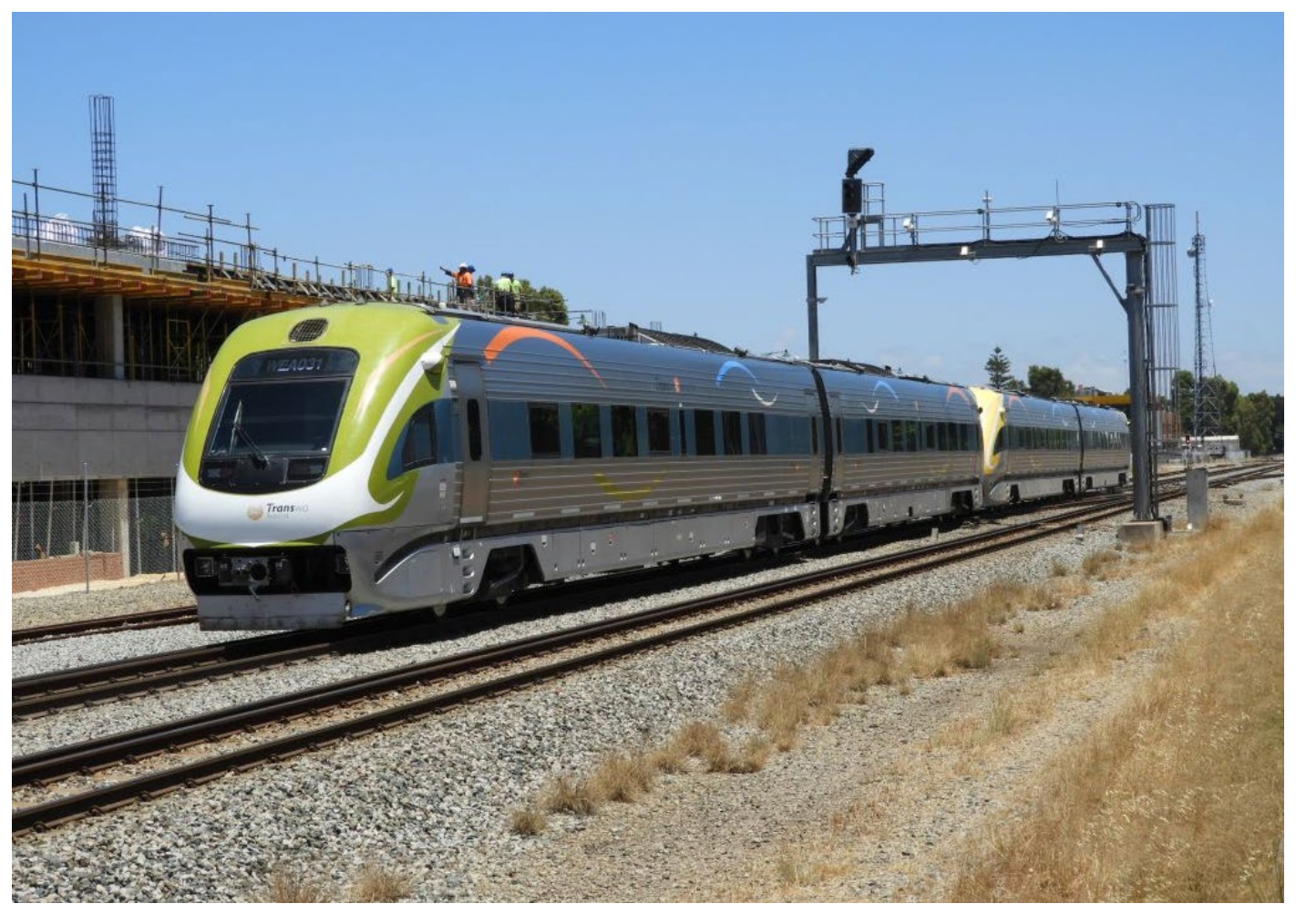
Page 18 of 28