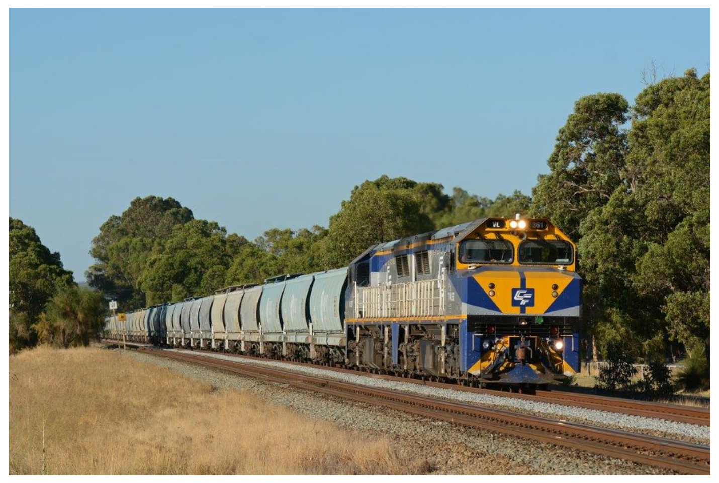
4S56 runs through Herne Hill behind VLs 361 & 357, 9<sup>th</sup> January.