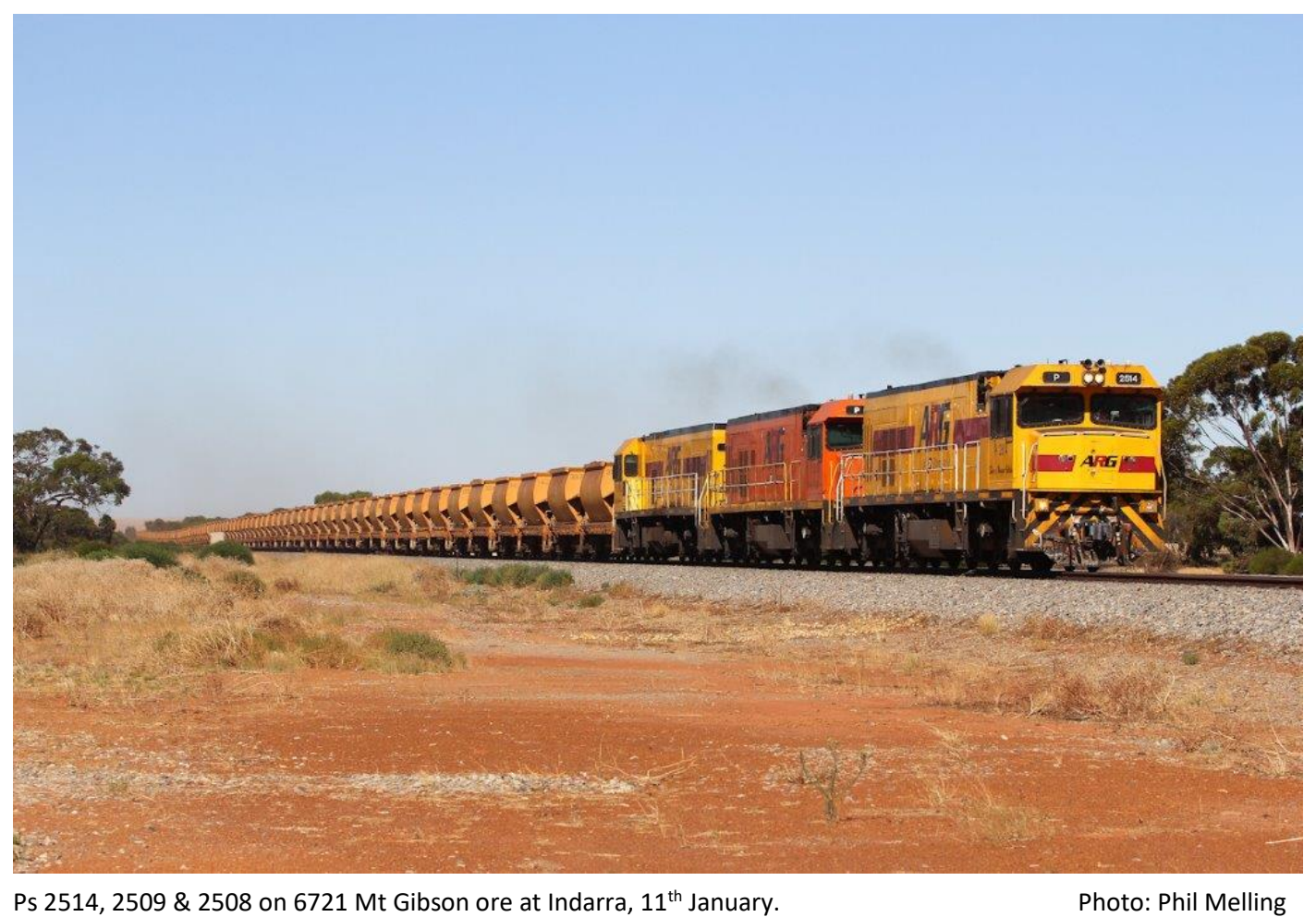
Ps 2514, 2509 & 2508 on 6721 Mt Gibson ore at Indarra, 11<sup>th</sup> January.