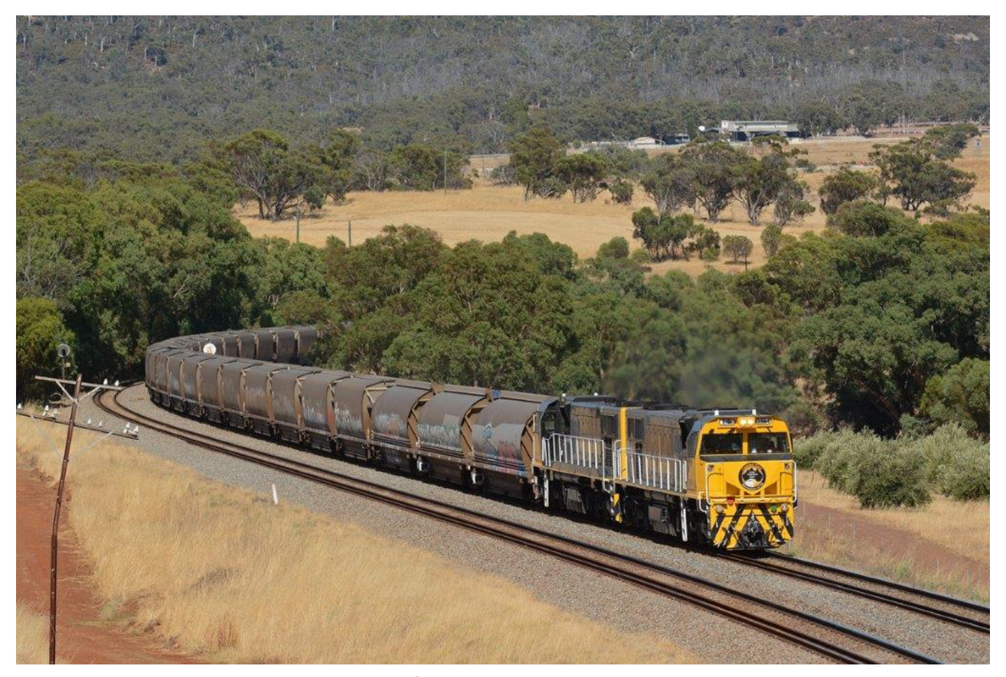
DRs 1565 & 1564 lead 4K04 through Toodyay, 9<sup>th</sup> January.