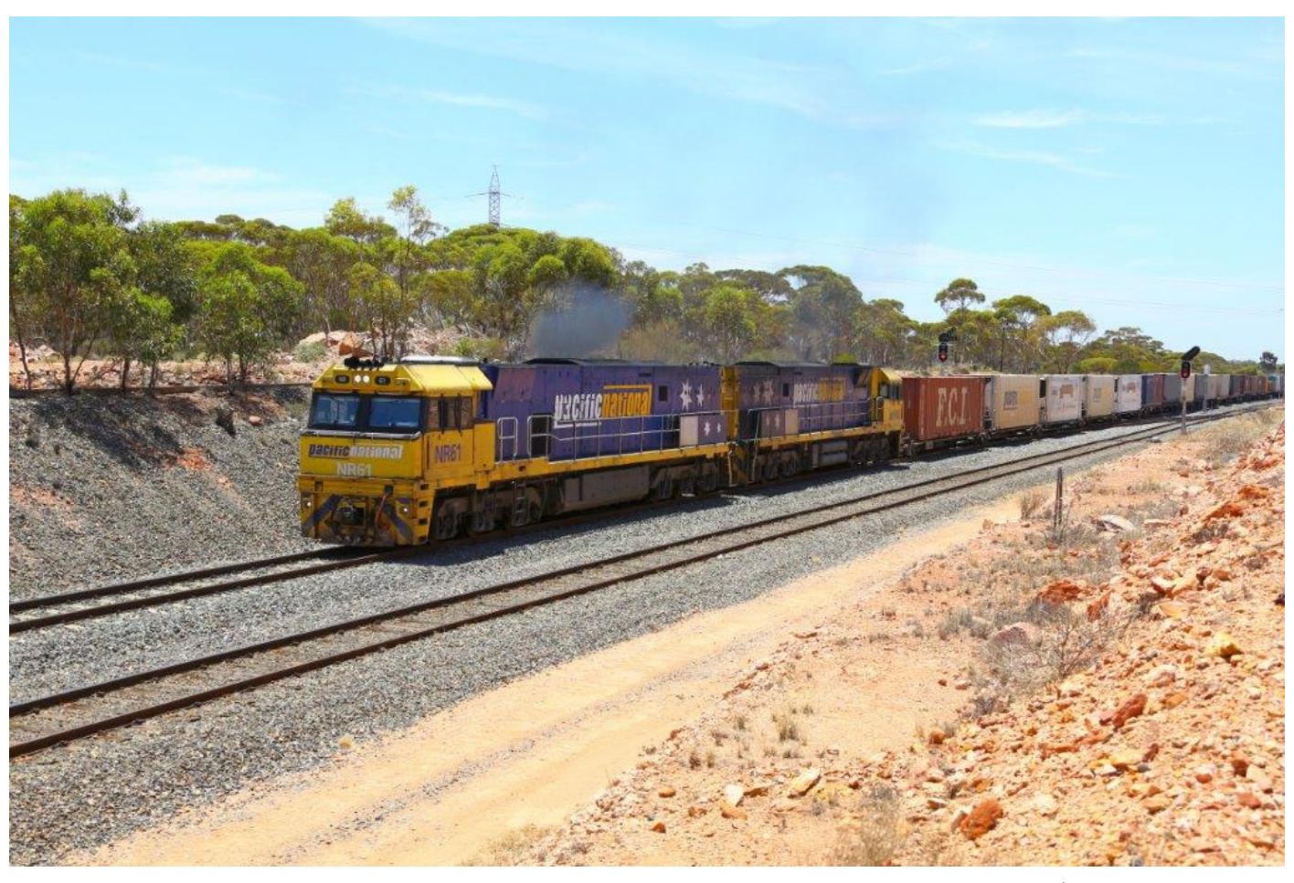
Nearly two days late due to 6MP9's broken wheel, 6SP7 departs West Kal behind NRs 61 & 52, 8<sup>th</sup> January