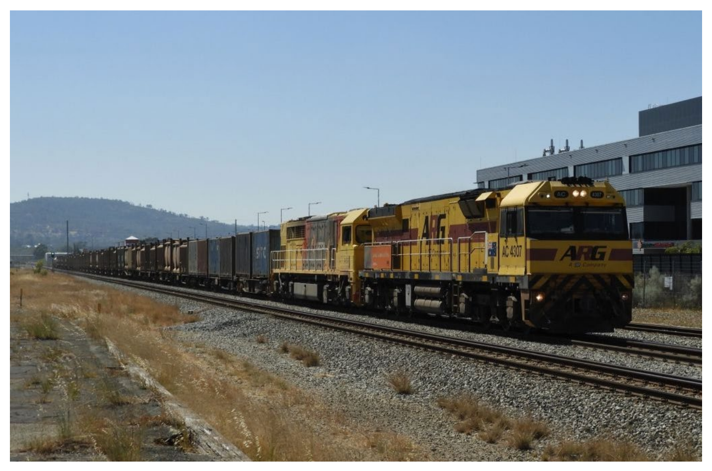
AC4307 & Q4009 lead 7430 empty sulphur through Midland, 13<sup>th</sup> January.