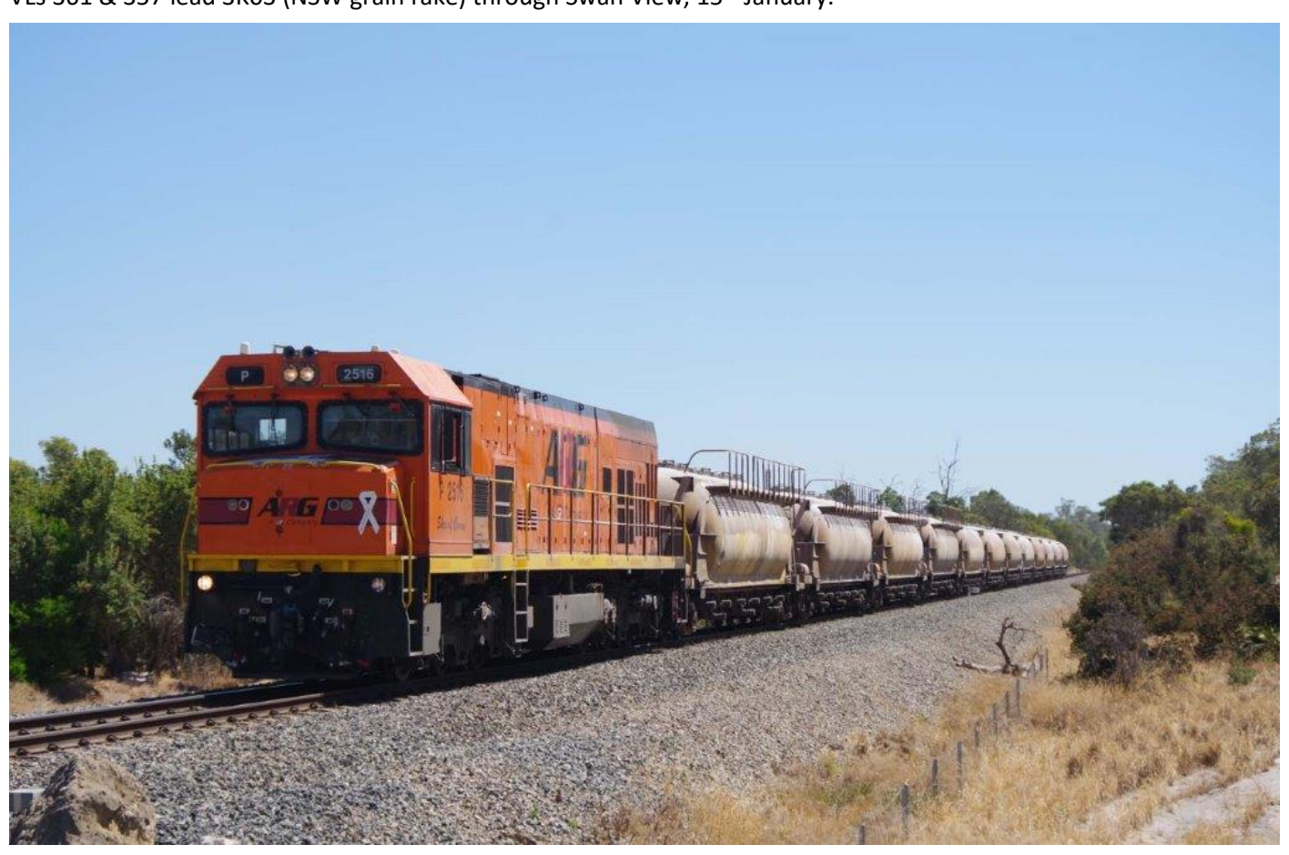
4271 rolls through Wellard behind P2516, 16<sup>th</sup> January.