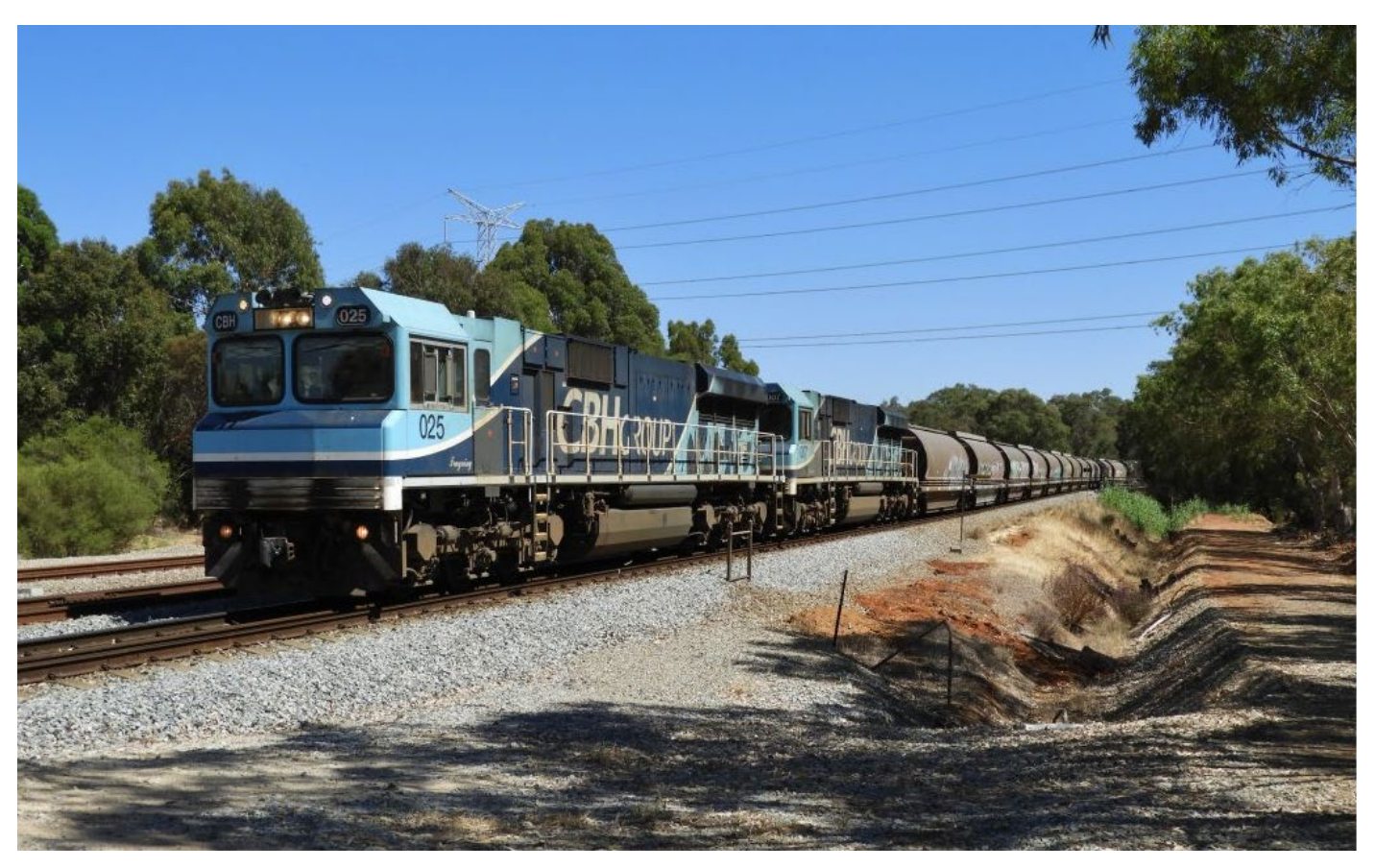
CBHs 025 & 007 lead the empty XT grain hopper rake through Woodbridge, 9<sup>th</sup> January (return of page 6's train).