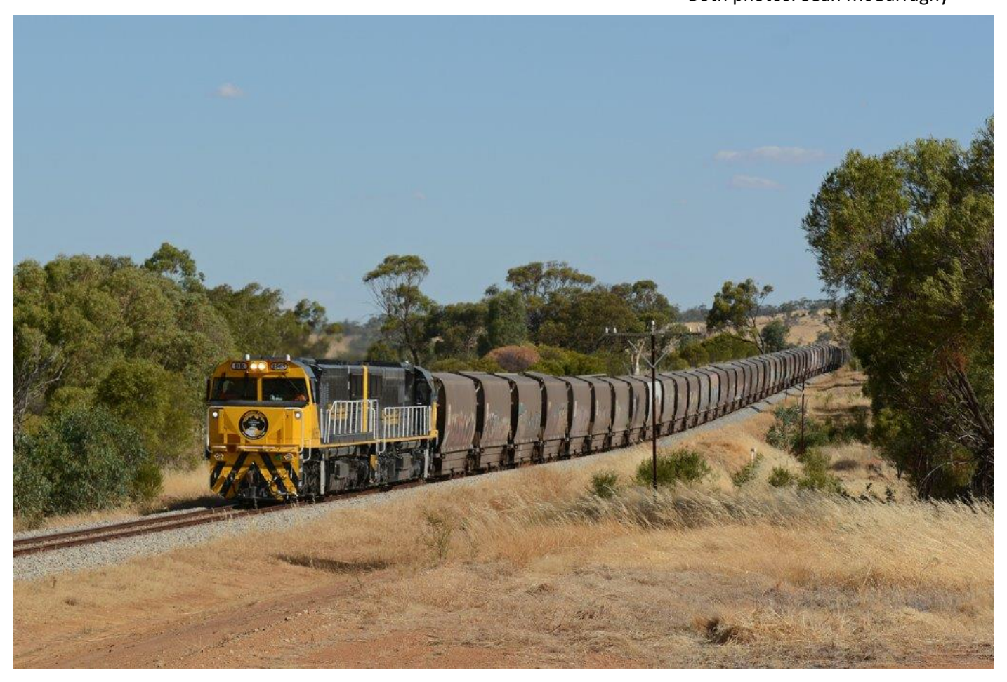
Page 15 of 28