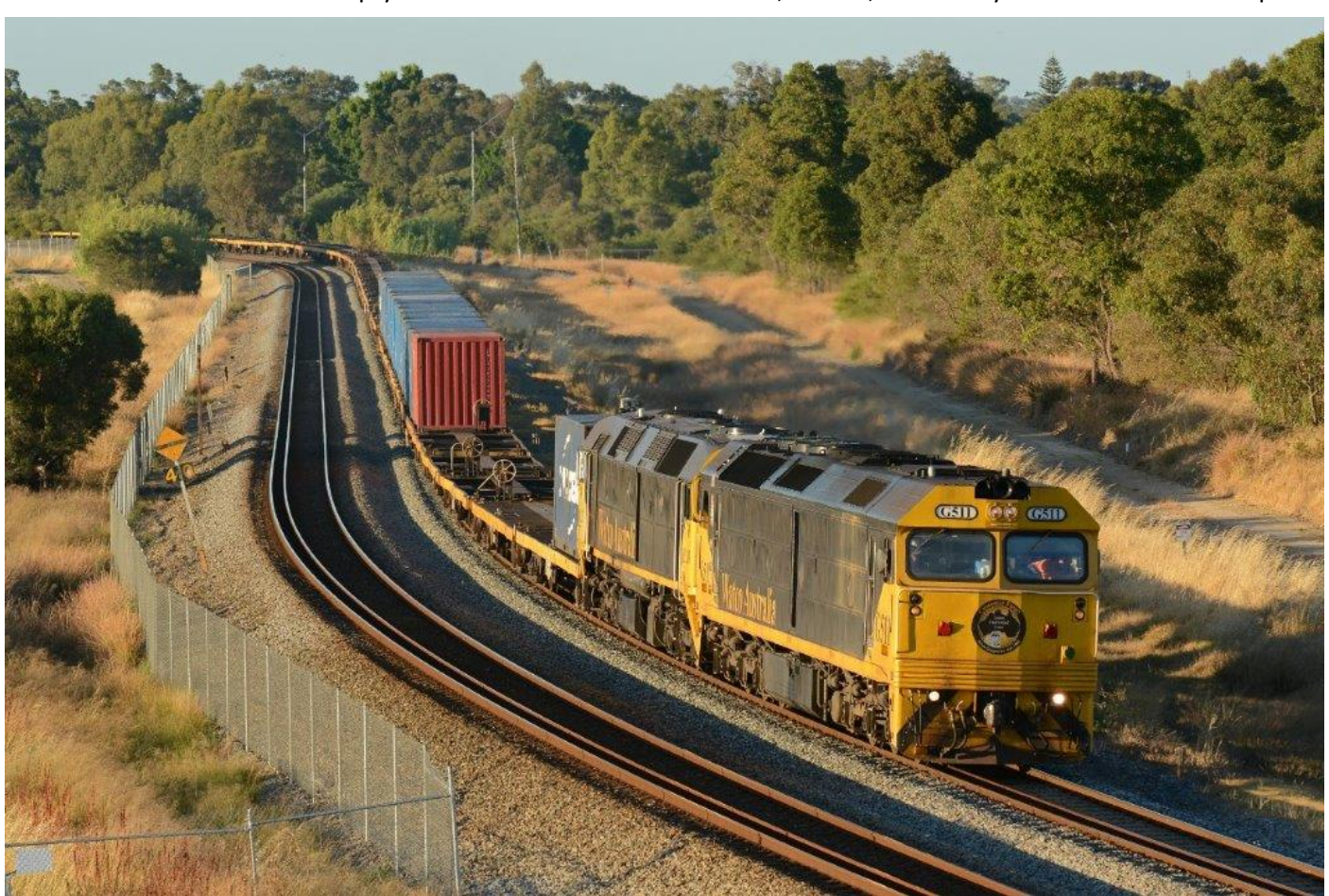
G511 & HL203 on 4141 container shuttle, Wattle Grove, 9^{\text{th}} January.