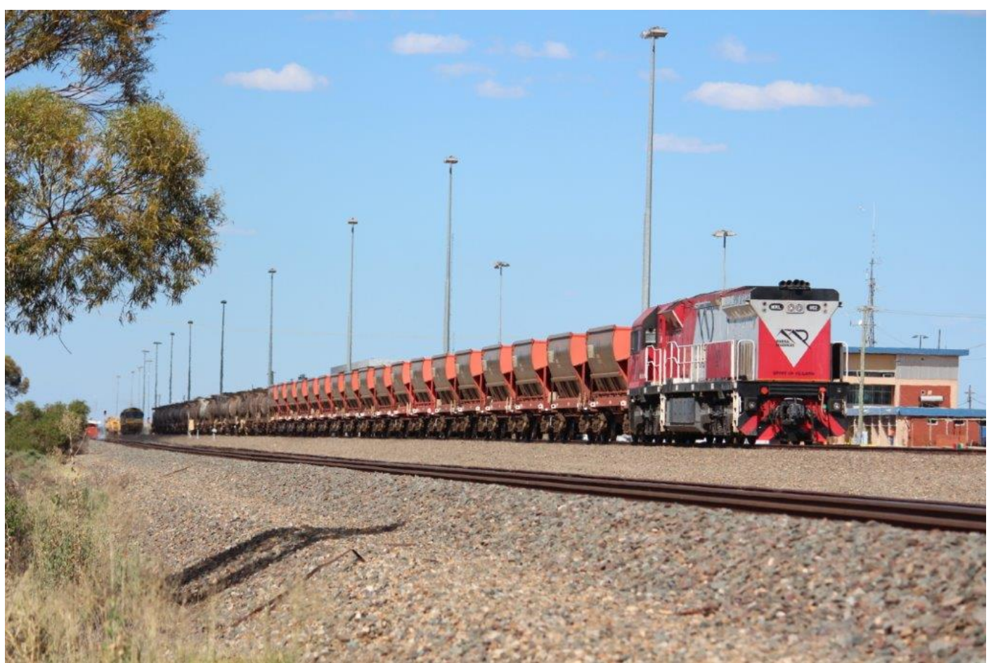
MRL002 and hoppers for transfer to Esperance on 445 fuel train, West Kalgoorlie, 7/1. Page 4 of 28