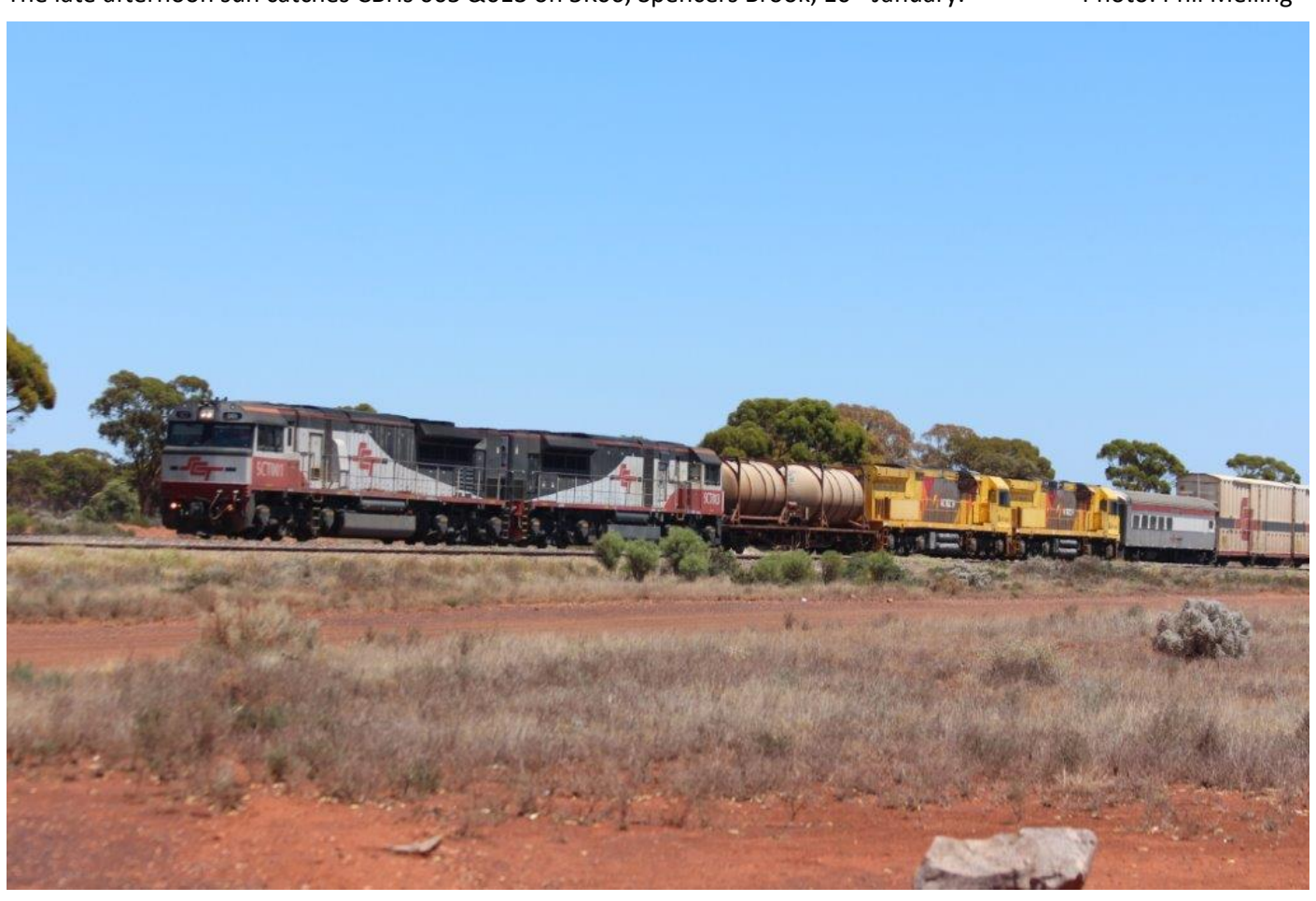
SCTs 001 & 013 haul ACBs 4405 & 4401 east on 5PM9, Parkeston, 11<sup>th</sup> January.