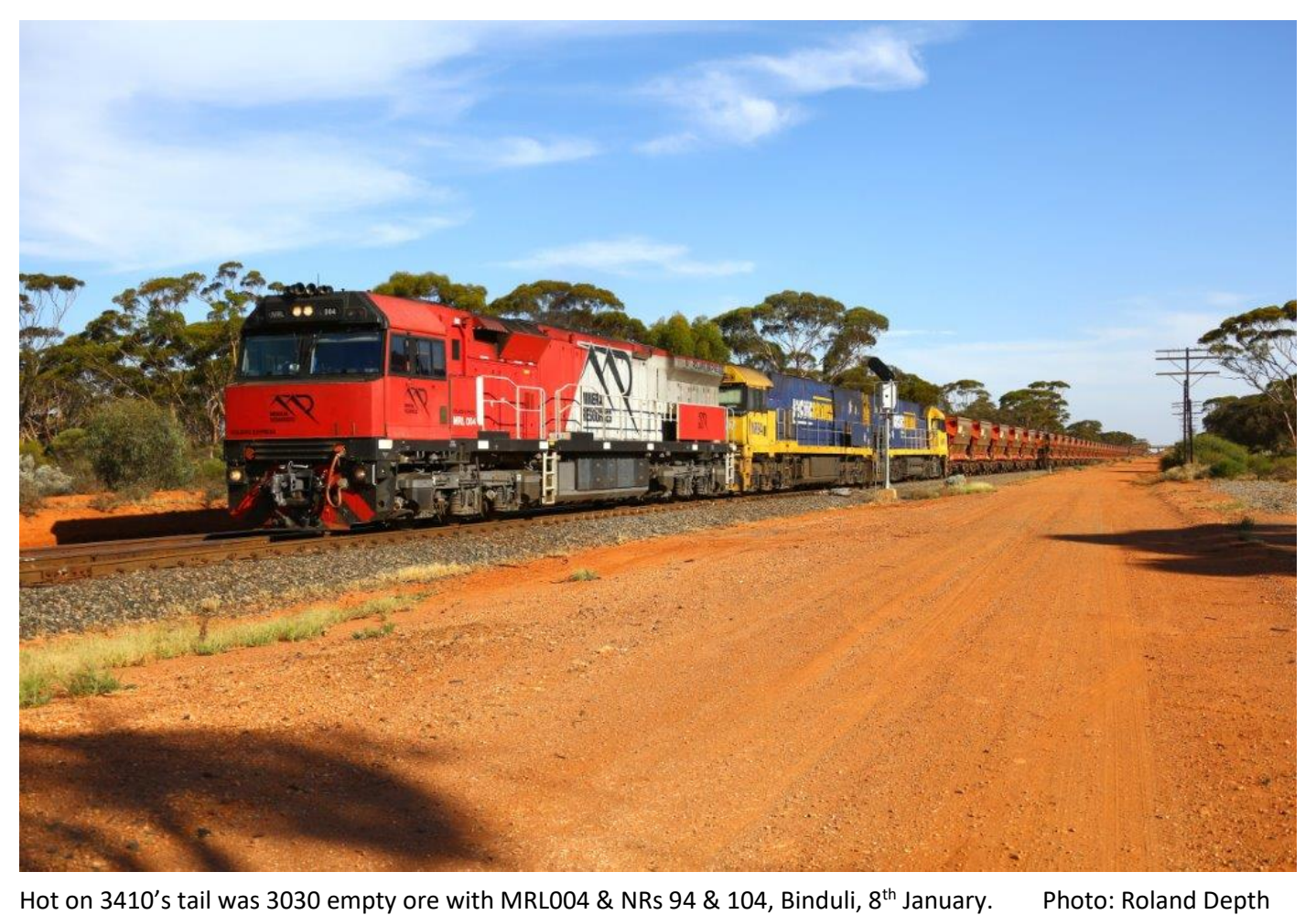
Hot on 3410's tail was 3030 empty ore with MRL004 & NRs 94 & 104, Binduli, 8<sup>th</sup> January.