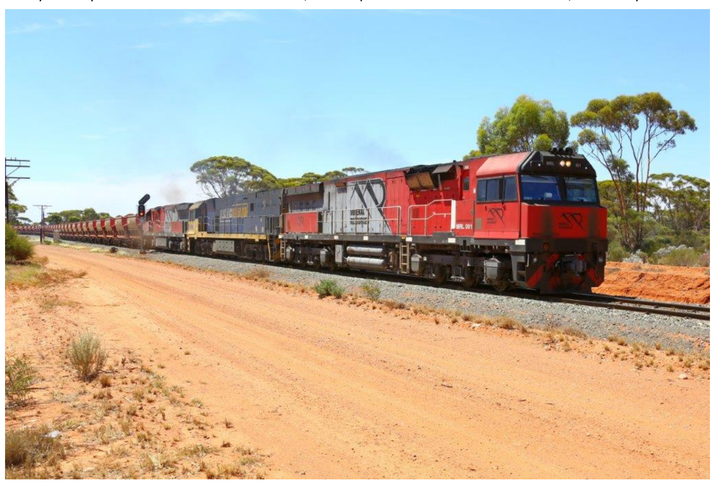
MRL001, NR80 & MRL005 depart Binduli with 3033 loaded ore, 8^{\text{th}} January. Page {\bf 7} of {\bf 28}