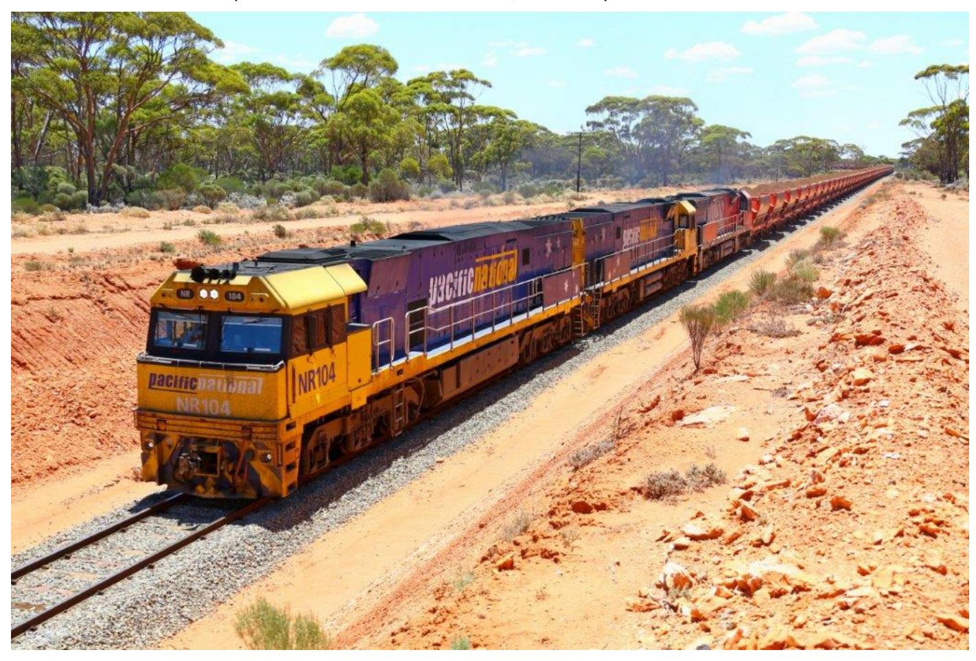
2033 ore departs Binduli behind NRs 104, 94 & MRL004, 7^{\text{th}} January.