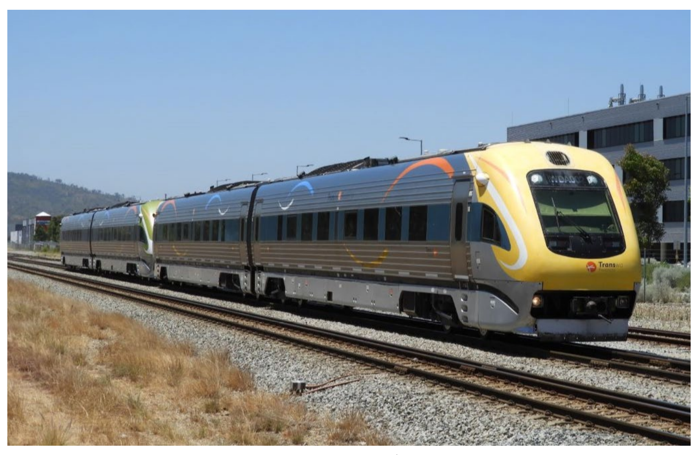
Prospector set 2 hauls the failed Avonlink set through Midland, 10<sup>th</sup> January.