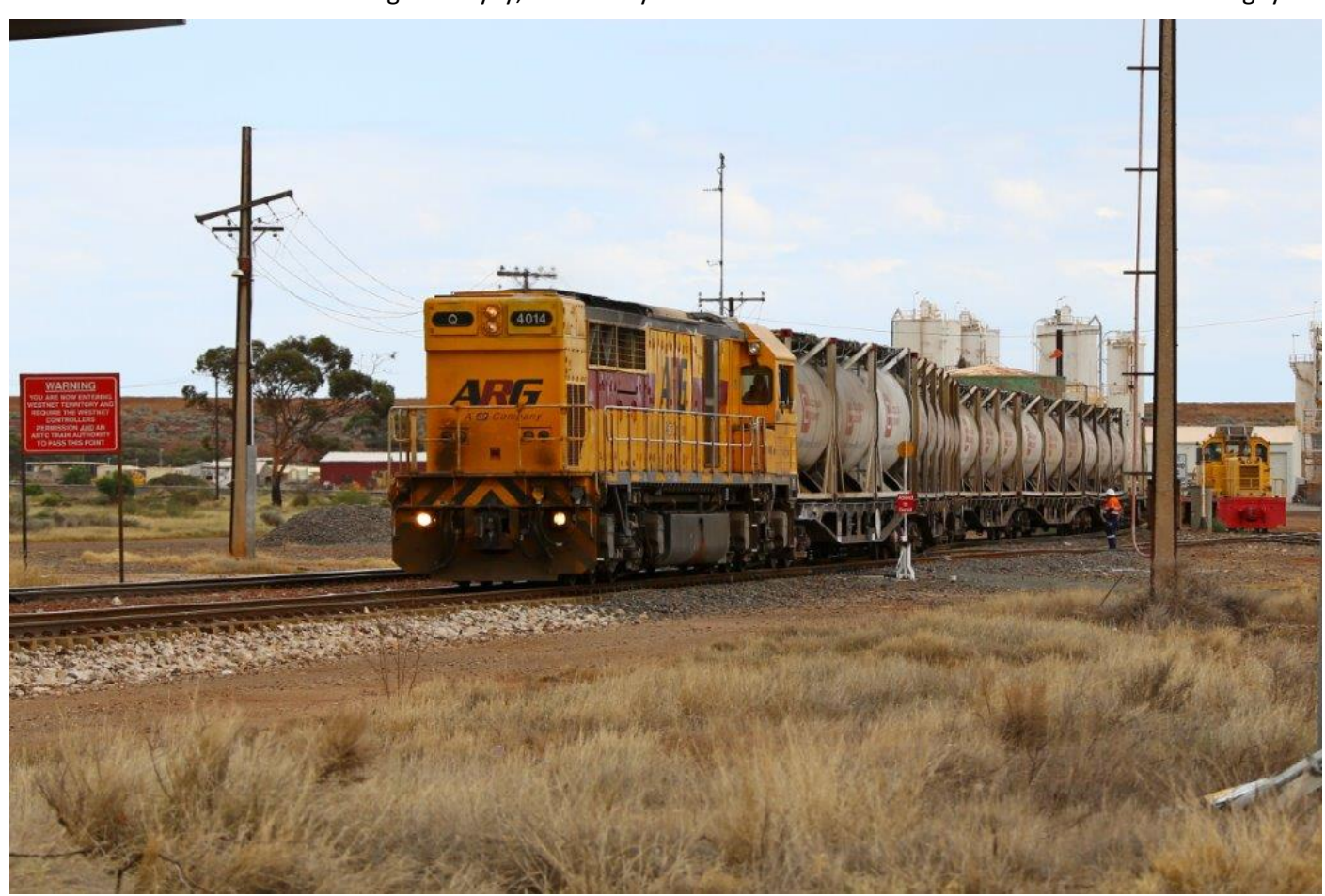
Q4014 takes the loop at Parkeston with 4C71, former BHP49 waits to shunt the wagons, 9/1. Page 11 of 28