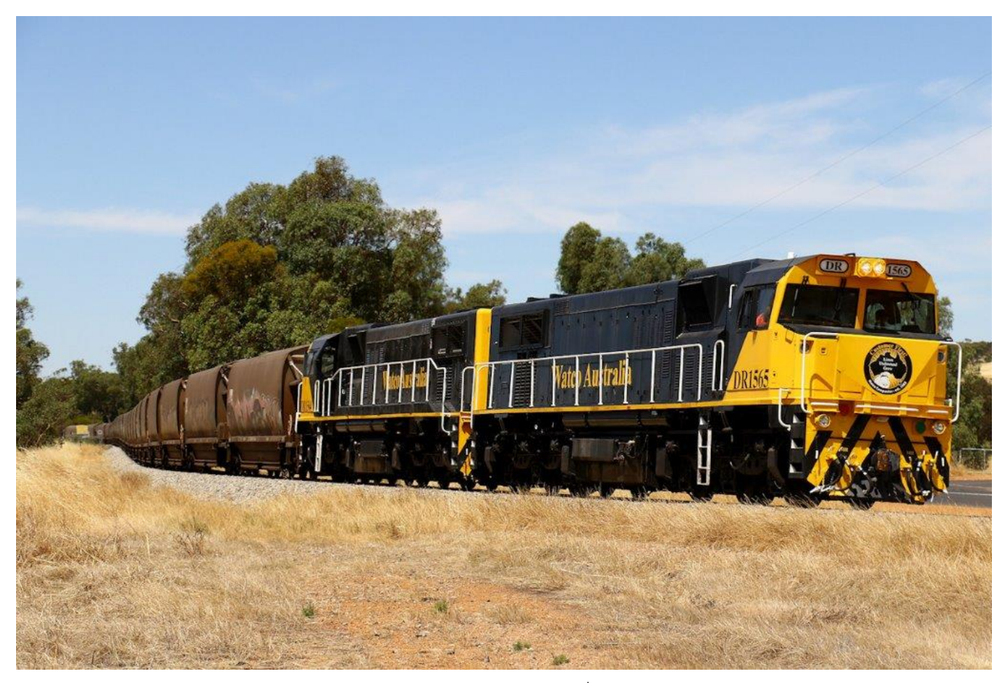
DRs 1565 & 1564 work 3K03 empty grain through Spencers Brook, 8^{th} January.