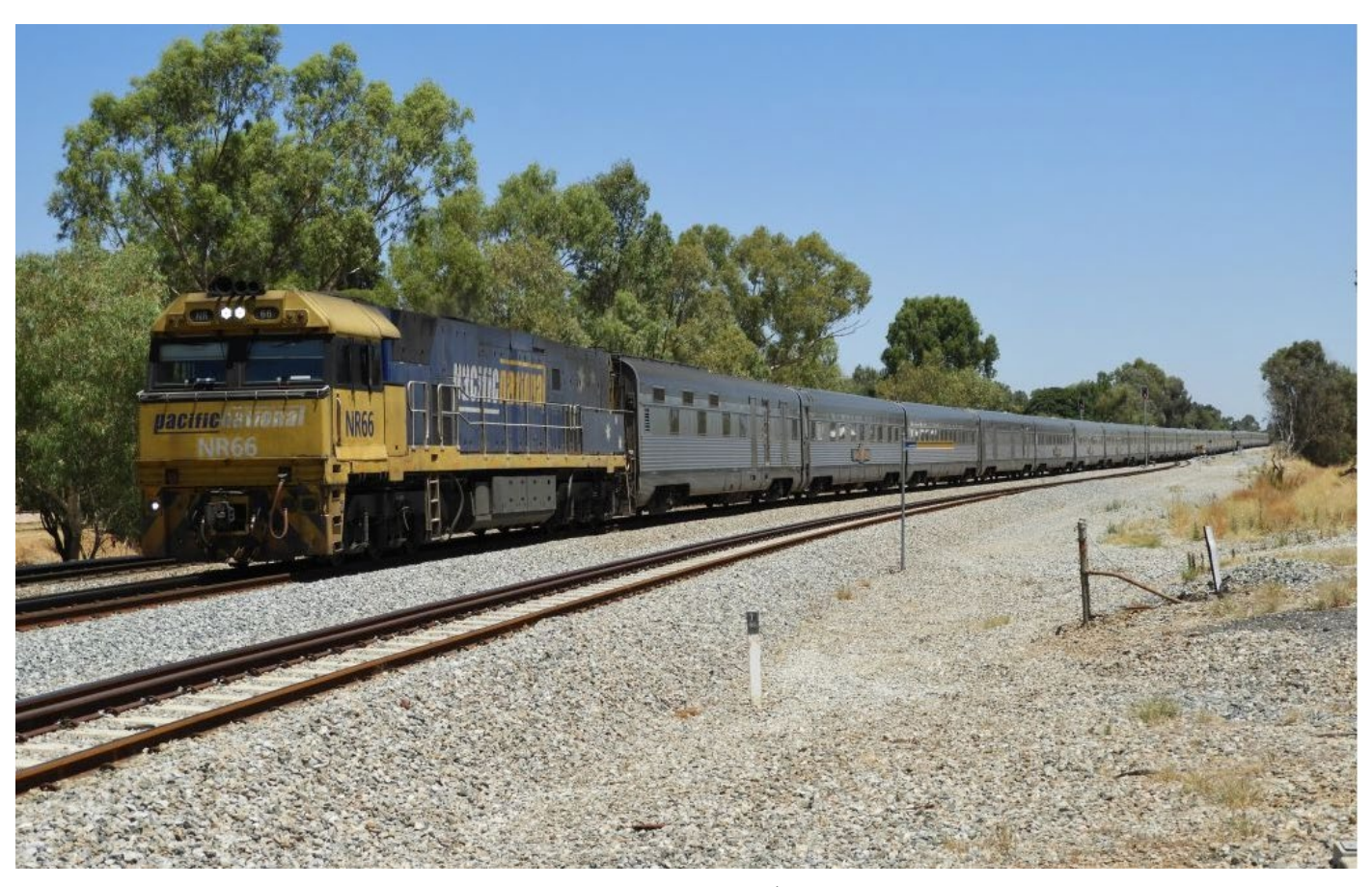
NR66 leads the empty Indian Pacific consist back to Adelaide on 7<sup>th</sup> January as 2PA8. Having departed from Kewdale instead of East Perth, this is a very rare run of the IP on the east side of the Woodbridge triangle.