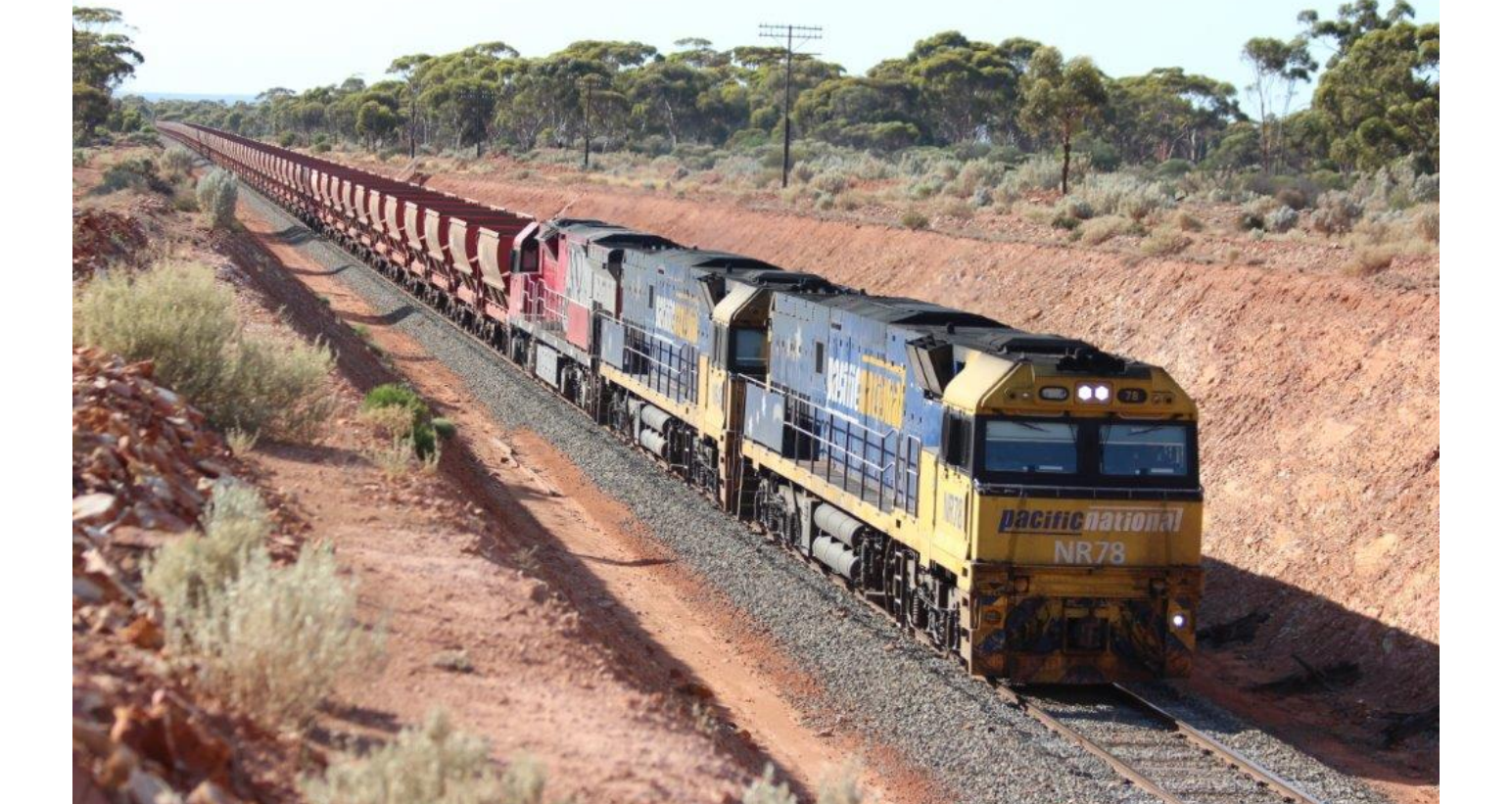
NRs 78 & 43 lead MRL003 on approach to Binduli with 6030 empty ore, 12^{th} January. Page 21 of 28