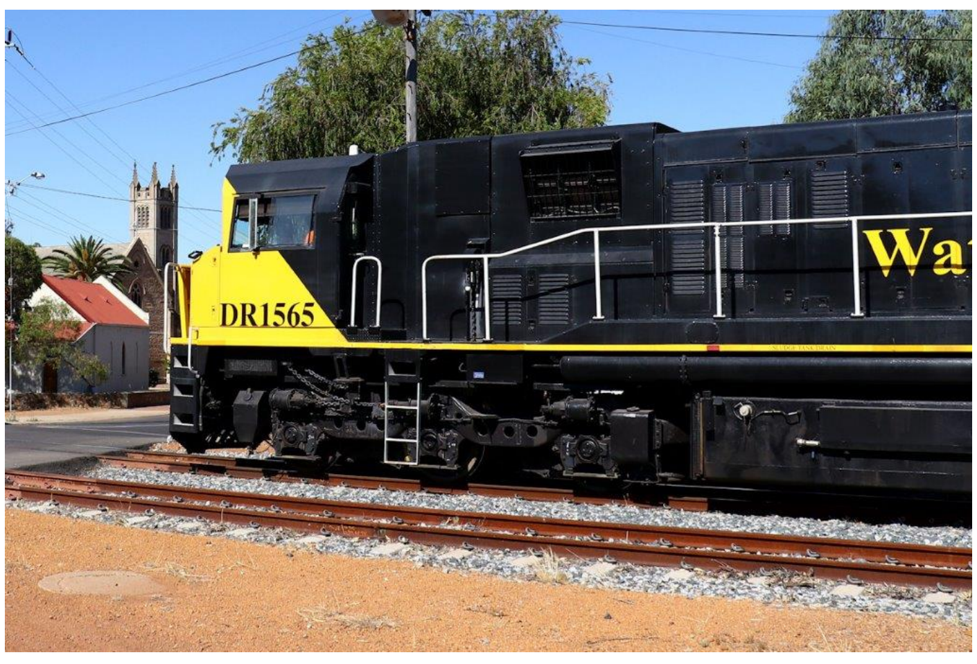
DR1565 with 4K04 loaded grain at York, St Patrick's church to the left, 9^{\text{th}} January.