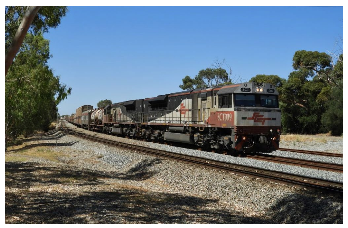
SCTs 009 & 006 on a very late 4PG1 in place of 3PG1, Woodbridge, 9<sup>th</sup> January. Several trains were renumbered to reflect their delayed departure following 6MP9's broken wheel.