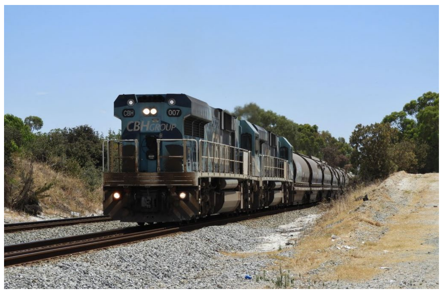
CBHs 007 & 025 have the XT grain hopper fleet in tow through Thornlie, 8<sup>th</sup> January.