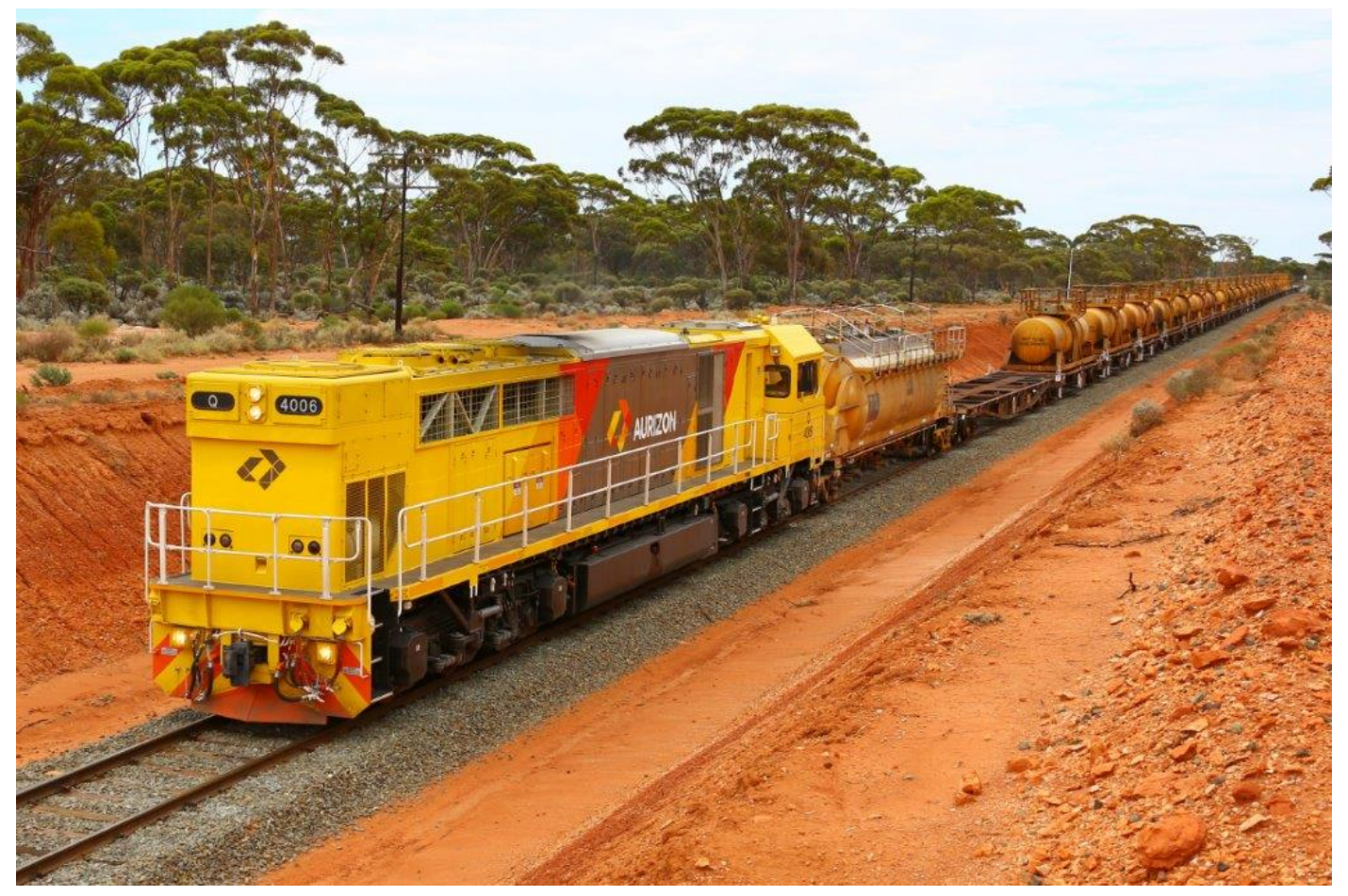
Q4006 hauls one loaded nickel wagon with the consist of 4405 empty acid to Hampton, 9/1. Page 13 of 28