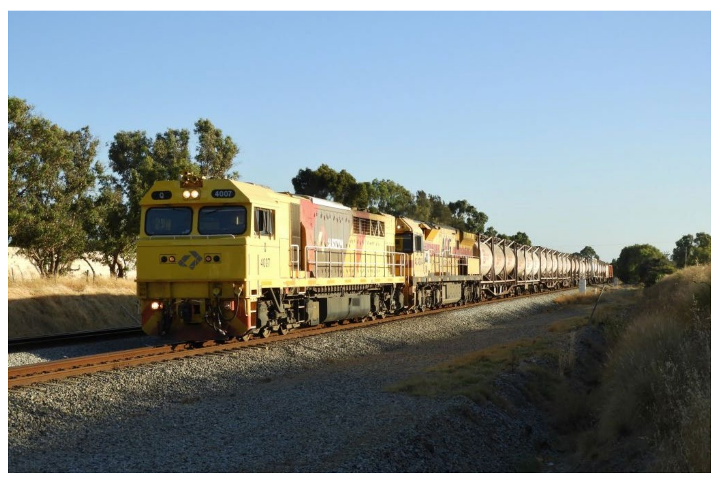
1025 to Kalgoorlie passes through South Guildford behind Q4007 & AC4304, 13^{\text{th}} January.