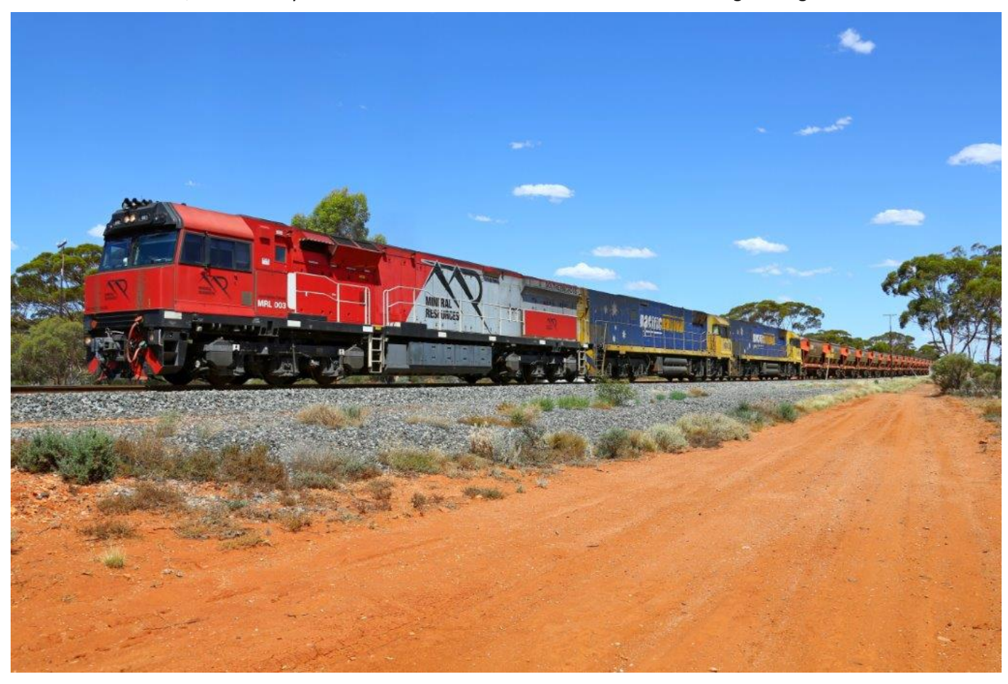
MRL003 with NRs 43 & 78 head 2034 empty ore at Binduli, 7<sup>th</sup> January.