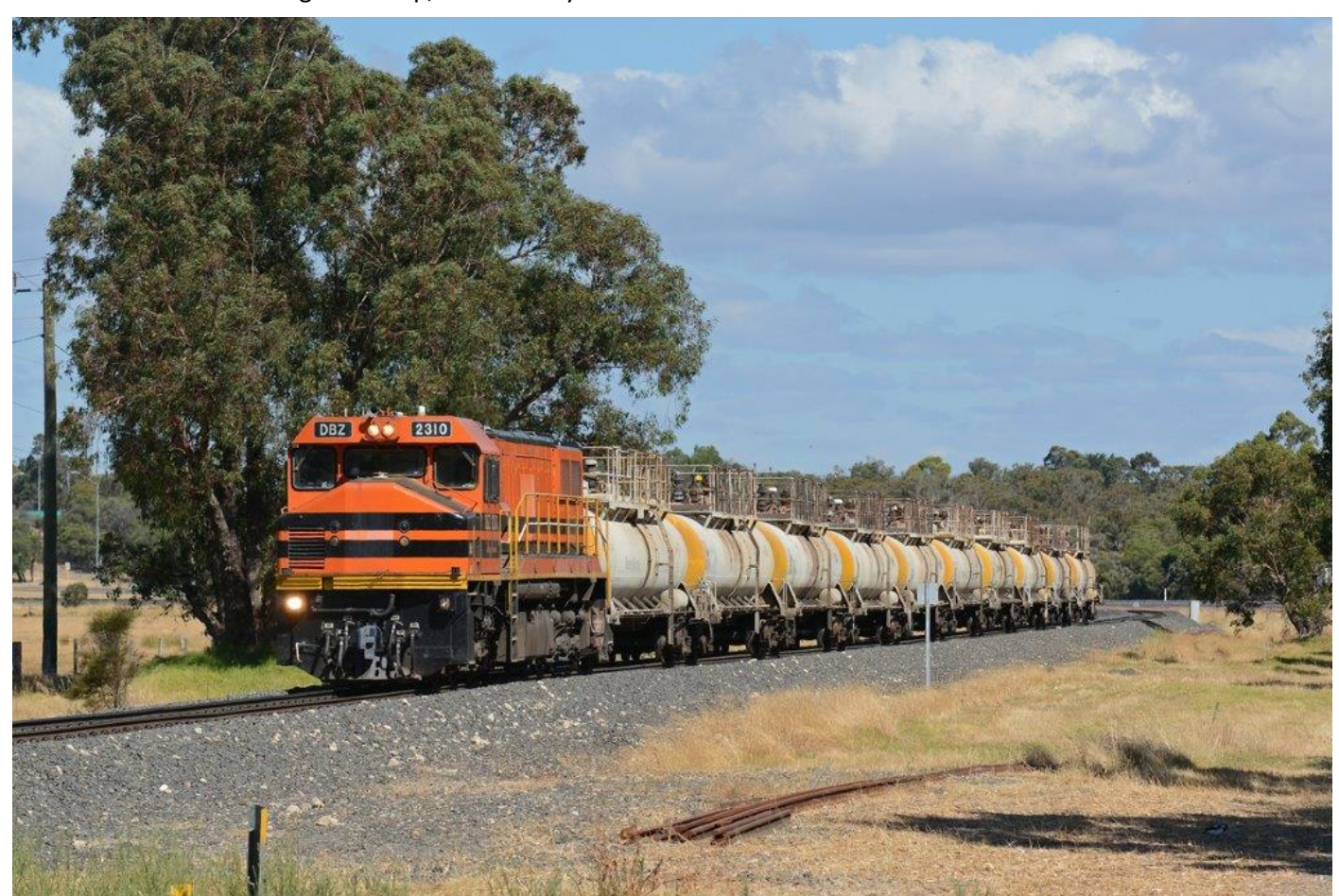
DBZ2310 leads 5854 at Bunbury, 17^{\text{th}} January.