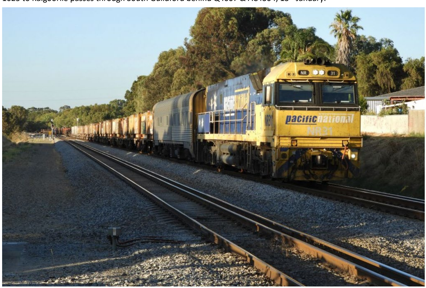
Solo NR31 leads 5MP2 steel through Hazelmere, 13<sup>th</sup> January.