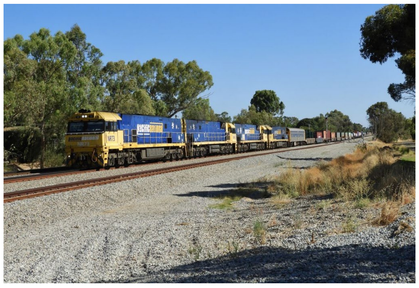
1PM5 passes through Woodbridge behind NRs 73, 48, 105 & 101, 13^{\text{th}} January.