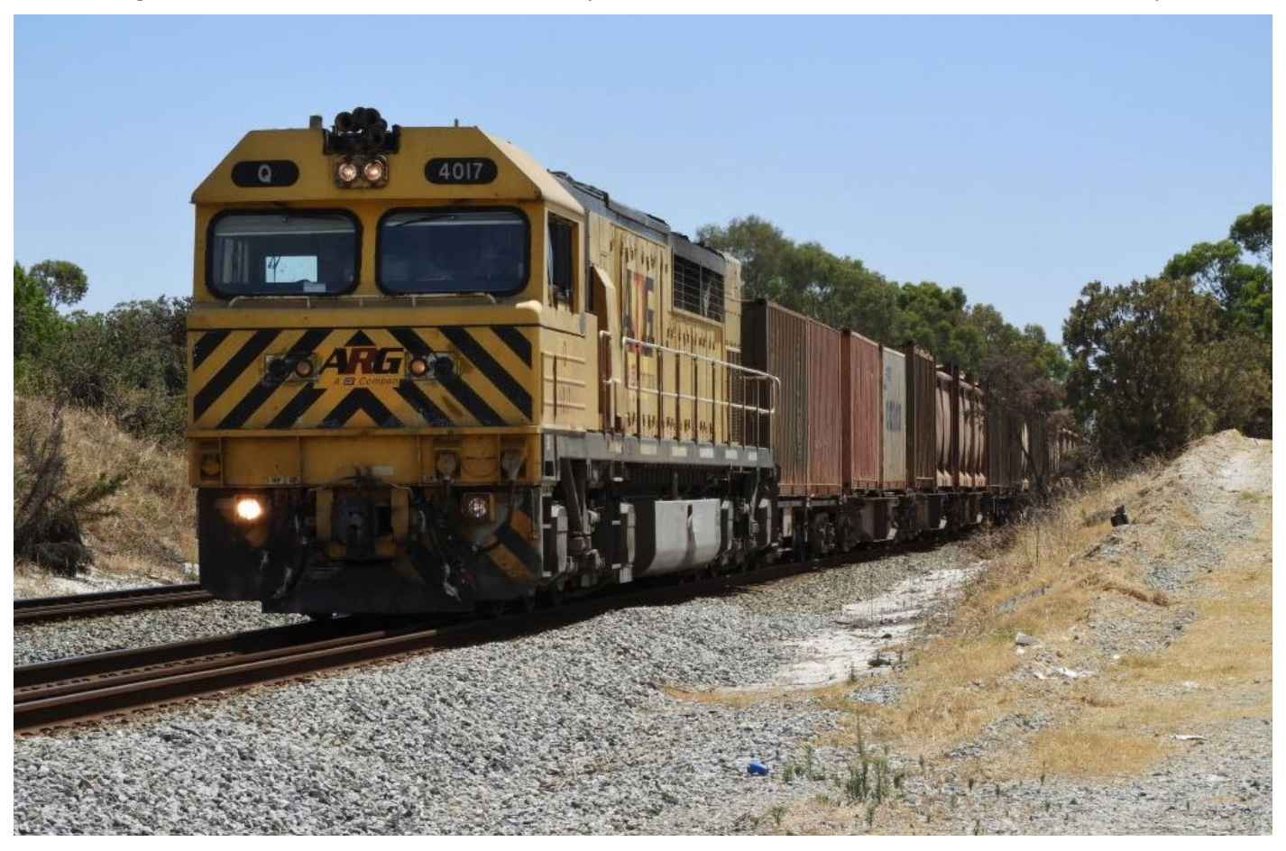
Q4017 hauls 2430 empty sulphur train through Thornlie, 8<sup>th</sup> January.