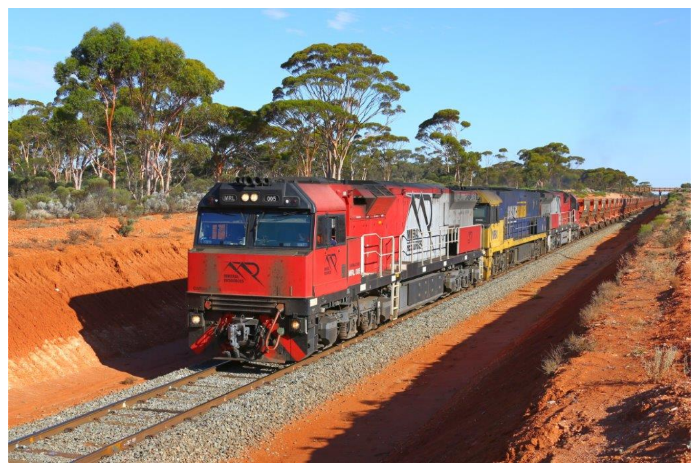
MRL005, NR80 & MRL001 bring 4030 empty ore into Binduli, 9^{th} January.