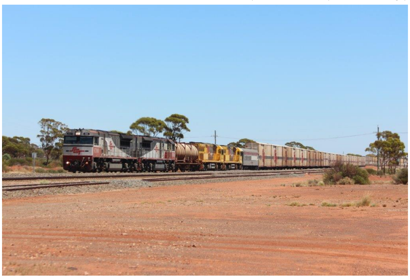
5PM9 rolls along the main at Parkeston, SCTs 001 & 013 hauling ACBs 4405 & 4401 to Hunter coal, 11^{th} January. Page 20 of 28