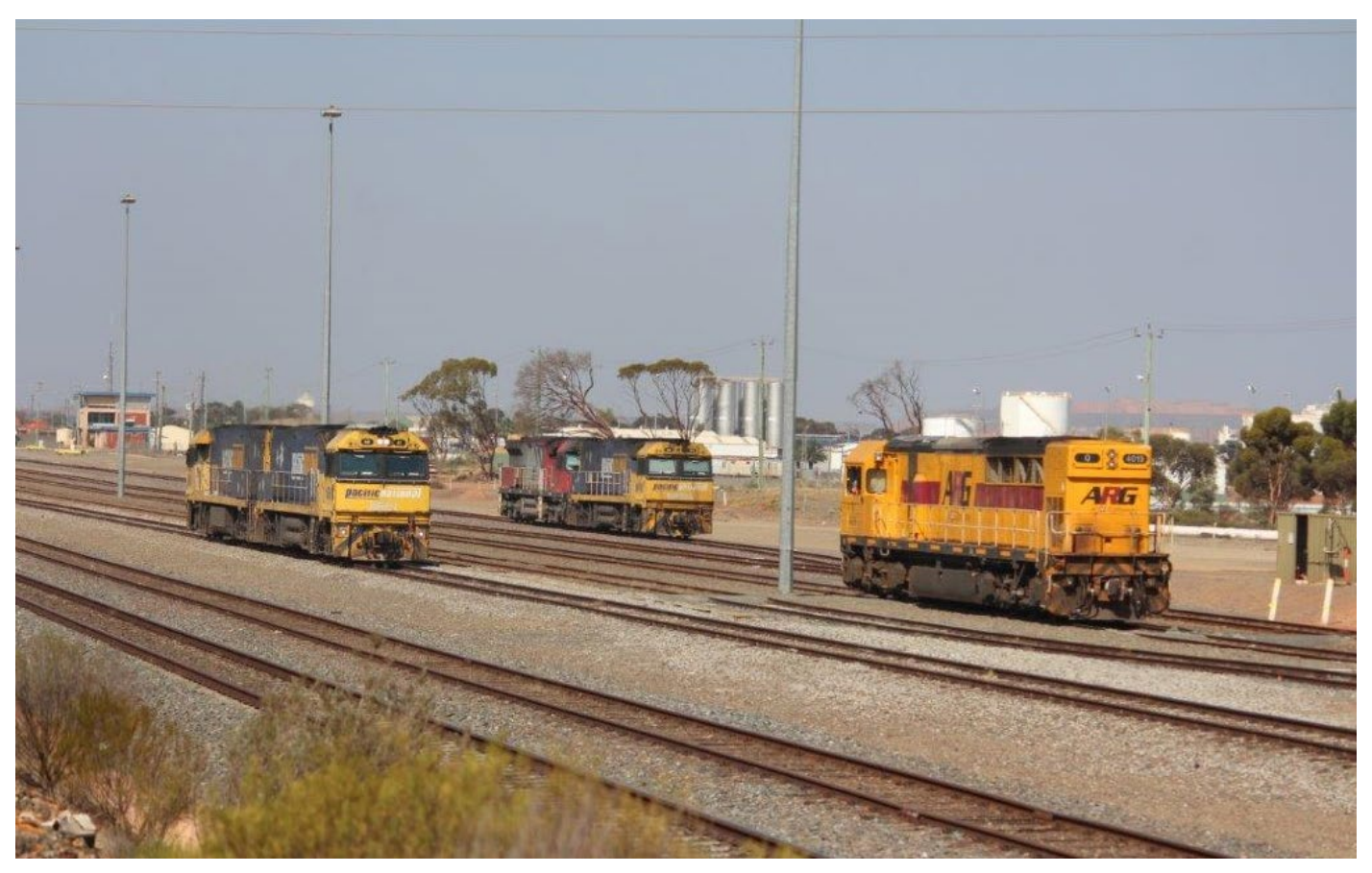
On 14^{th} January, West Kal yard held NRs 61 & 58, MRL001 & NR104, and Q4019.