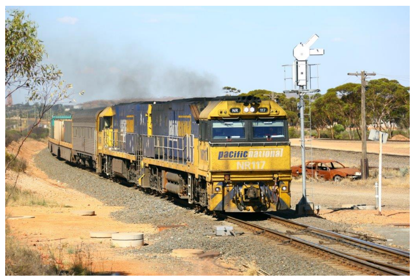
7MP5 enters West Kalgoorlie yard behind NRs 117 & 68, 8<sup>th</sup> January.