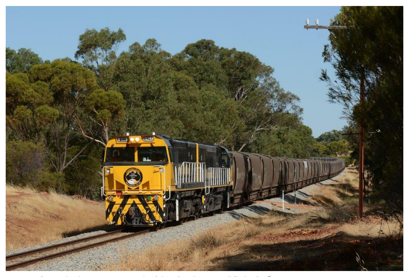
DRs 1565 & 1564 haul 4K04 at Hammersley (above) and Spring Hill (below), 9<sup>th</sup> January.