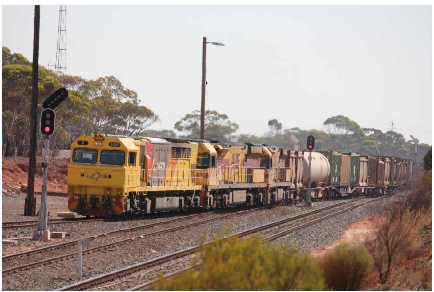
Delayed by bushfires, 1029 was combined with 1025 at West Merredin. Just on ten hours late, 1025 enters smoky West Kal behind Q4007 with ACs 4304 & 4306, 14<sup>th</sup> January.