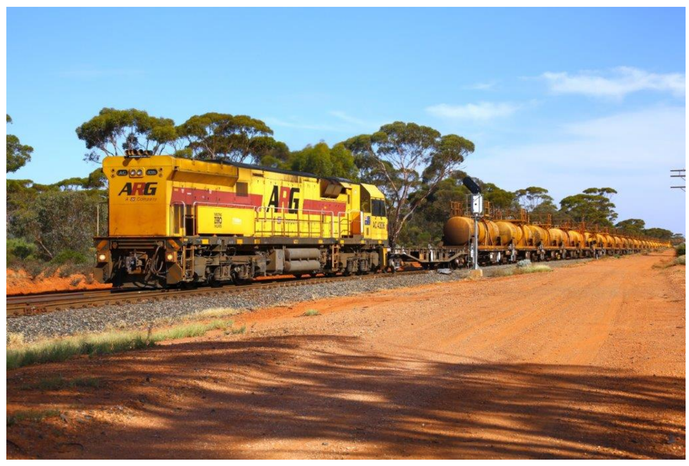
AC4306 hauls 3410 loaded acid shunt from Hampton through Binduli, 26 tanks, 2172 tonnes, 8^{th} January. Page 9 of 28