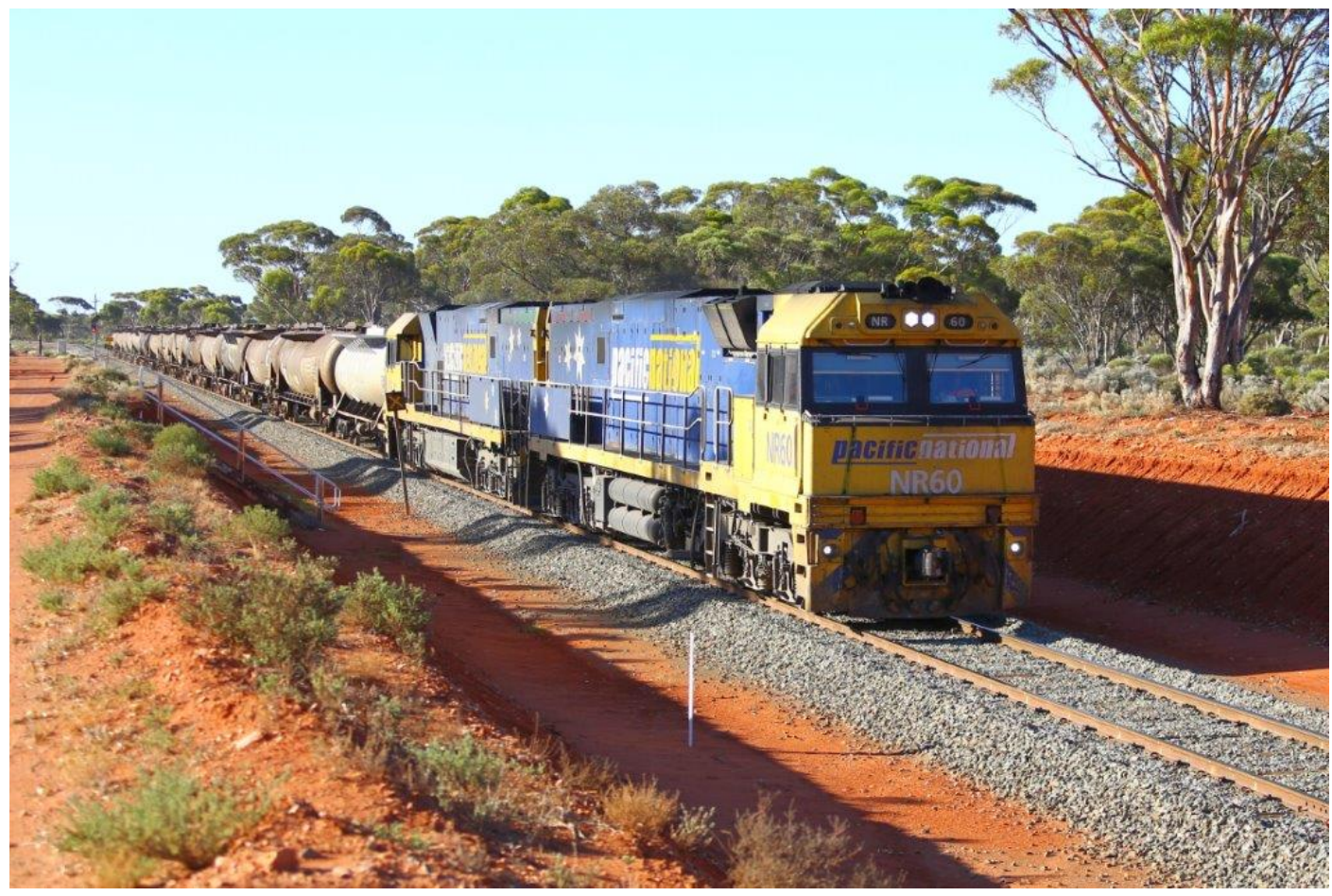
NRs 60 & 8 haul an early 4445 empty fuel through Binduli, 9^{\text{th}} January.