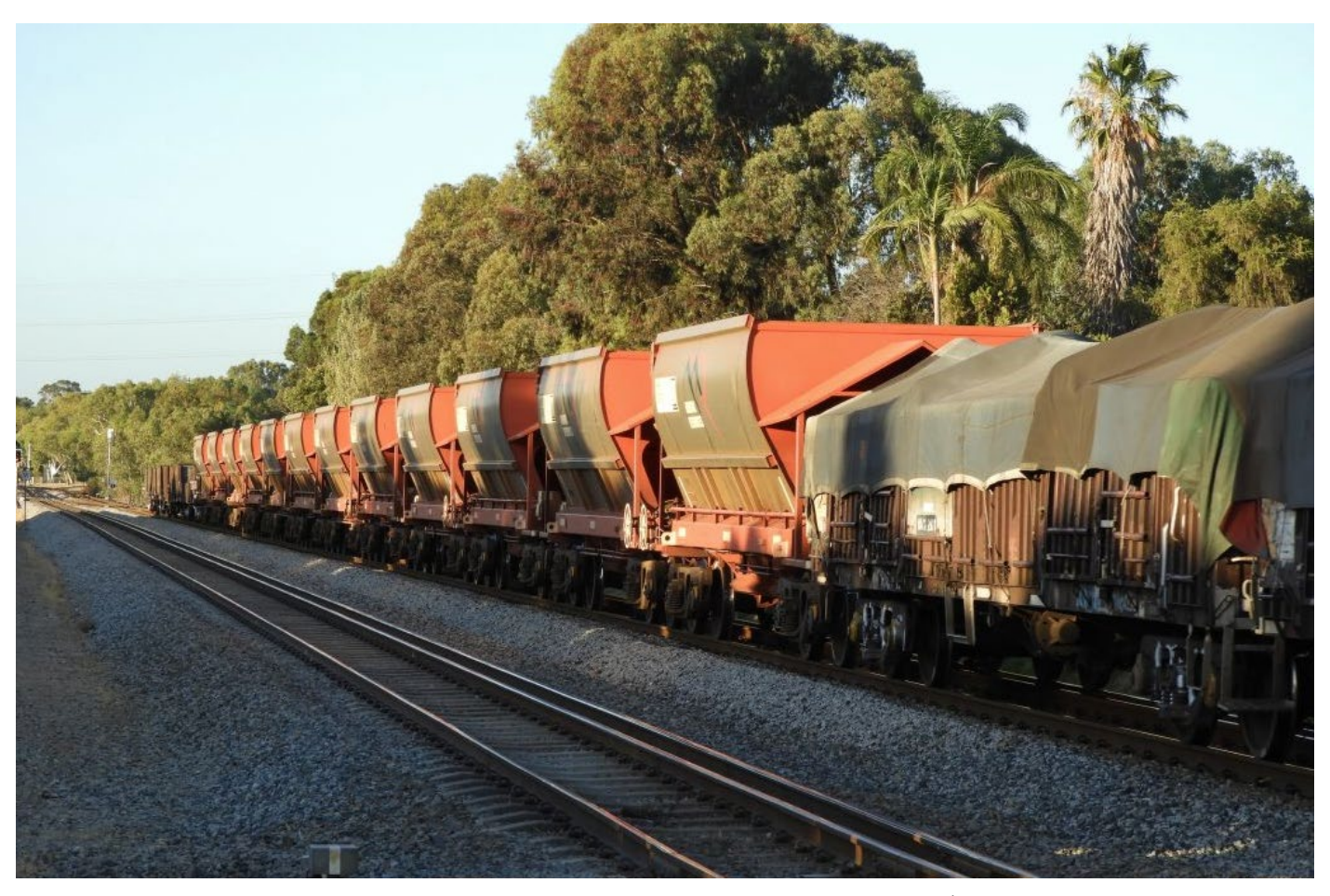
A block of twelve MHPYs transferring from Esperance on 5MP2 for maintenance, 13<sup>th</sup> January.