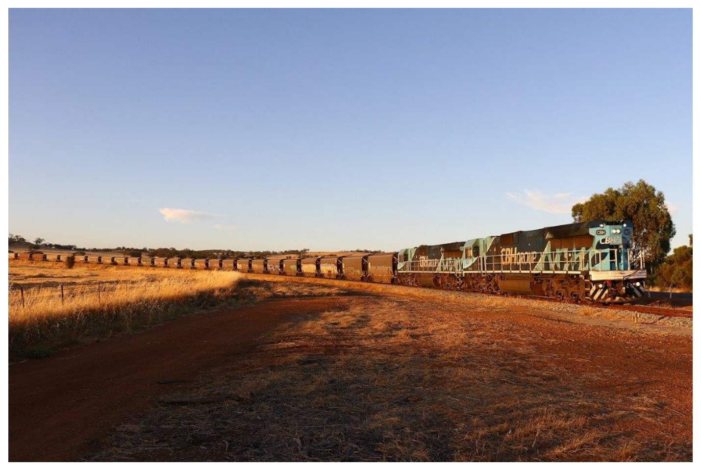
The late afternoon sun catches CBHs 005 &013 on 5K06, Spencers Brook, 10<sup>th</sup> January.