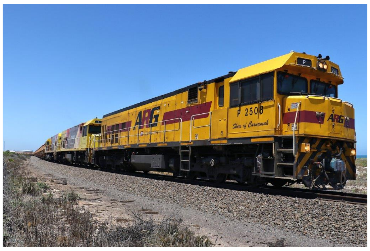
Ps 2508, 2517 & 2506 lead 6721, the last loaded Mt Gibson ore through Beachlands, 1st February.