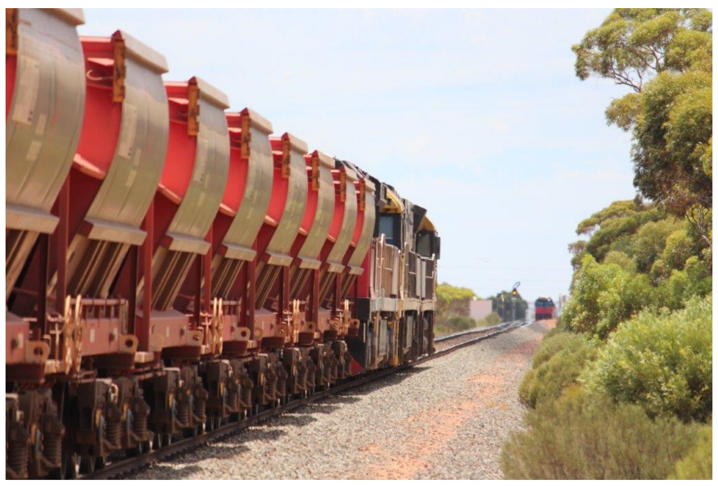
1030 approaches Hampton loop while 1033 waits on the main line for the cross, 3^{rd} February.