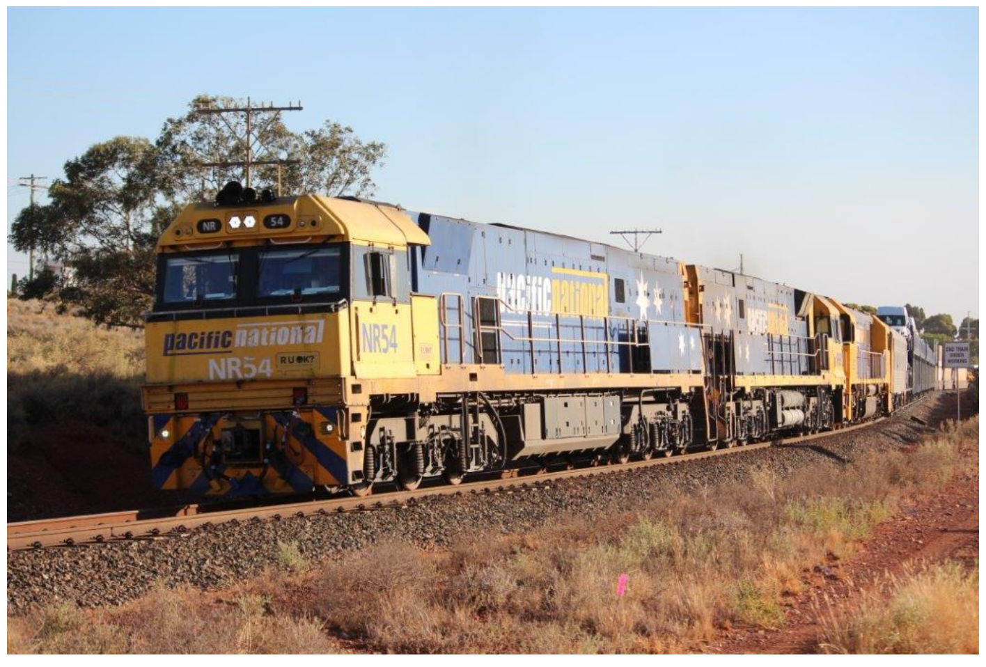
NRs 54 & 96 haul 8222 through Kal on 6-hour late 6PM6, The 82 was returning east after several months as Esperance port shunter, after a plan to run 82s with the MRLs on Kooly ore trains was abandoned, 2<sup>nd</sup> February.