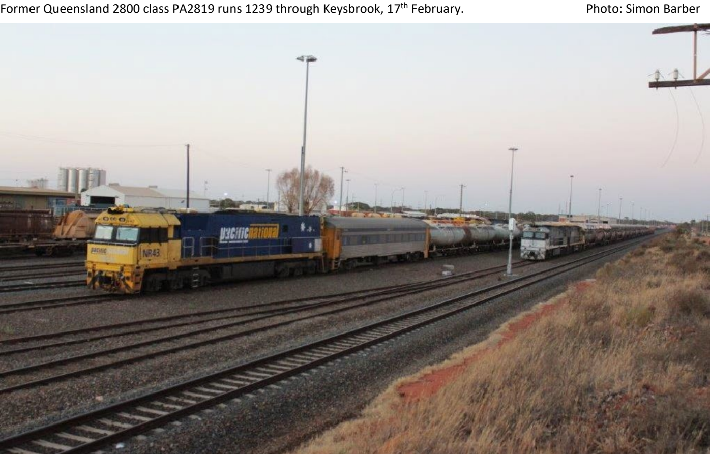
Due to the Kultanaby derailment, 7PX4 (NR43) was stabled on the arrival road at West Kalgoorlie for several days, forcing NRs 85 & 42 on the Esperance fuel train to use the loop. Also stabled in the yard for the duration was 1PA8 Indian Pacific (NR31 visible beside the 2<sup>nd</sup> and 3<sup>rd</sup> fuel tanks on PX4), 18<sup>th</sup> February. Passengers remained aboard the first night!