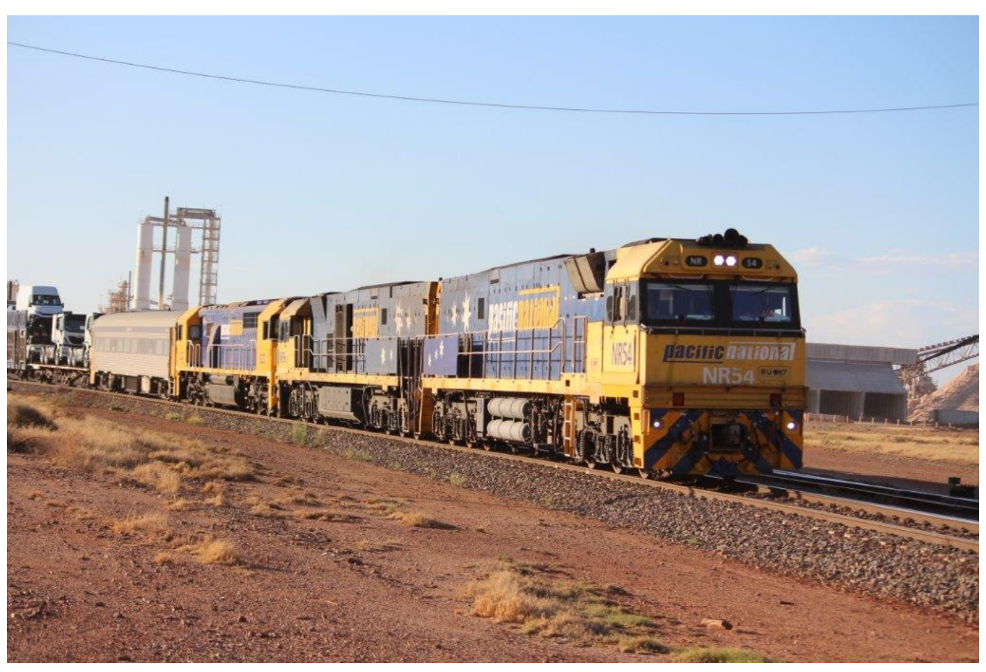
6PM6 approaches Parkeston behind NRs 54 & 96 hauling 8222, 2<sup>nd</sup> February.