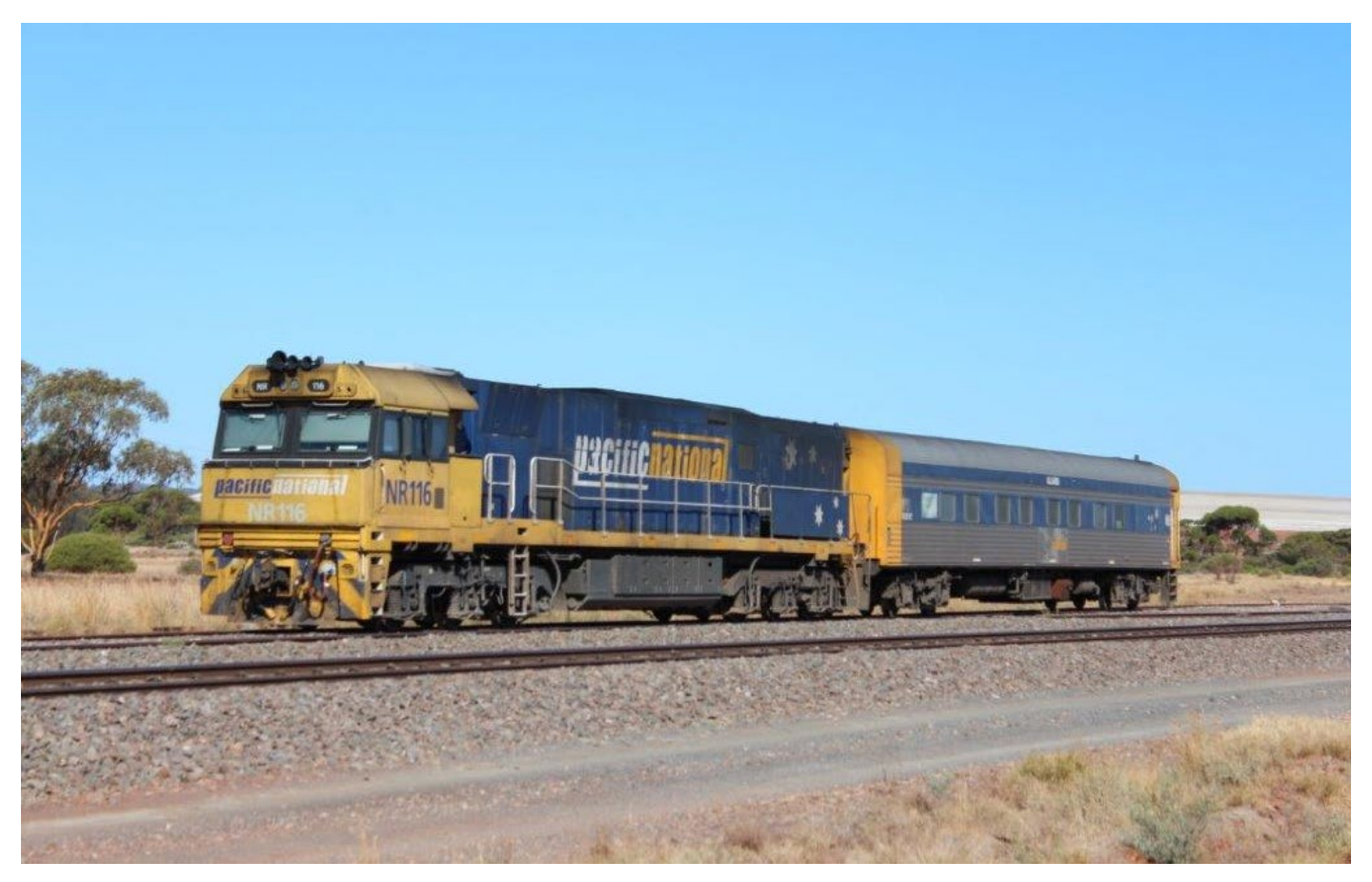
Due to a derailment just east of Kultanaby closing the Trans line on 16/2, NR116 and coach RZEY2 (former Overland sleeper Allambi, later coded JRB1) ran 8416S "taxi" to ferry un-needed crews from Cook back to Parkeston, 17/2.