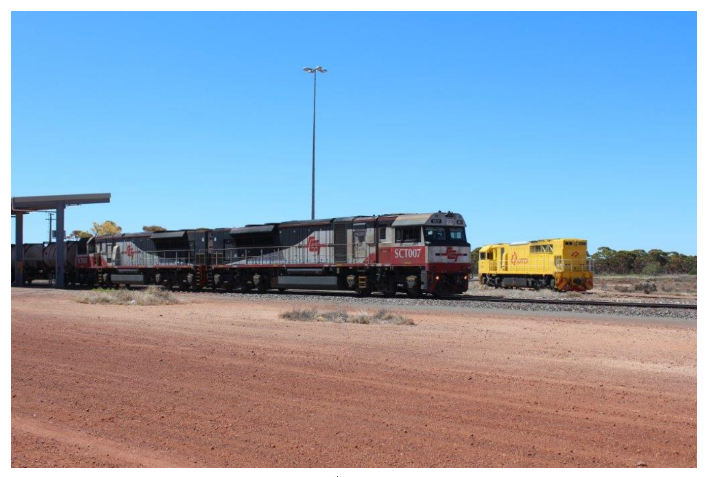
SCTs 007 & 015 on 6PM9 pass stabled Q4003 at Parkeston, 9<sup>th</sup> February.