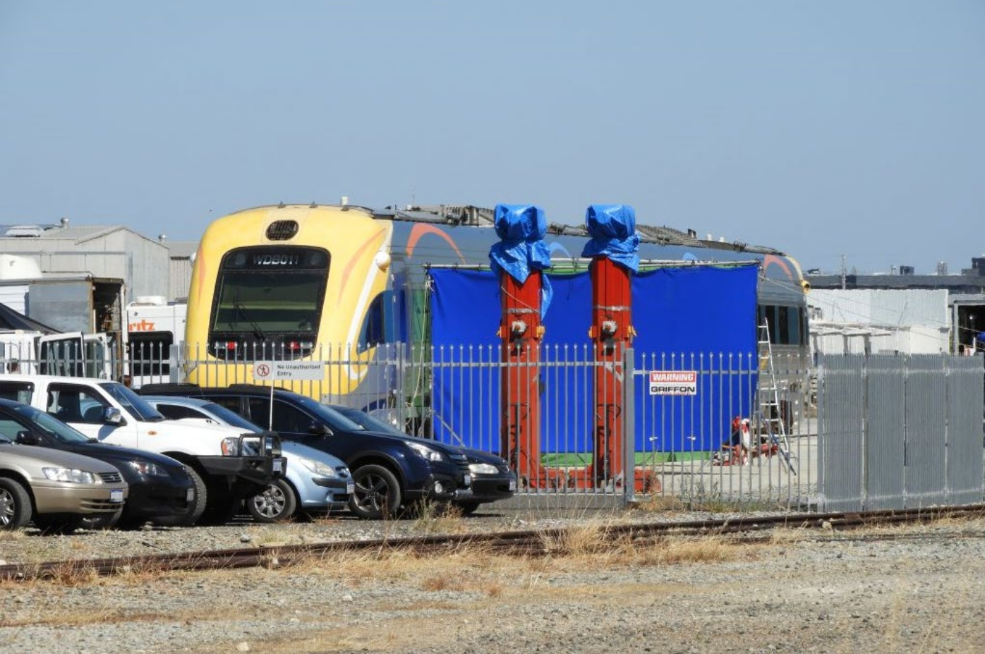
Prospector car WDB011 being used in filming the movie "Below", Bellevue, 20<sup>th</sup> February.