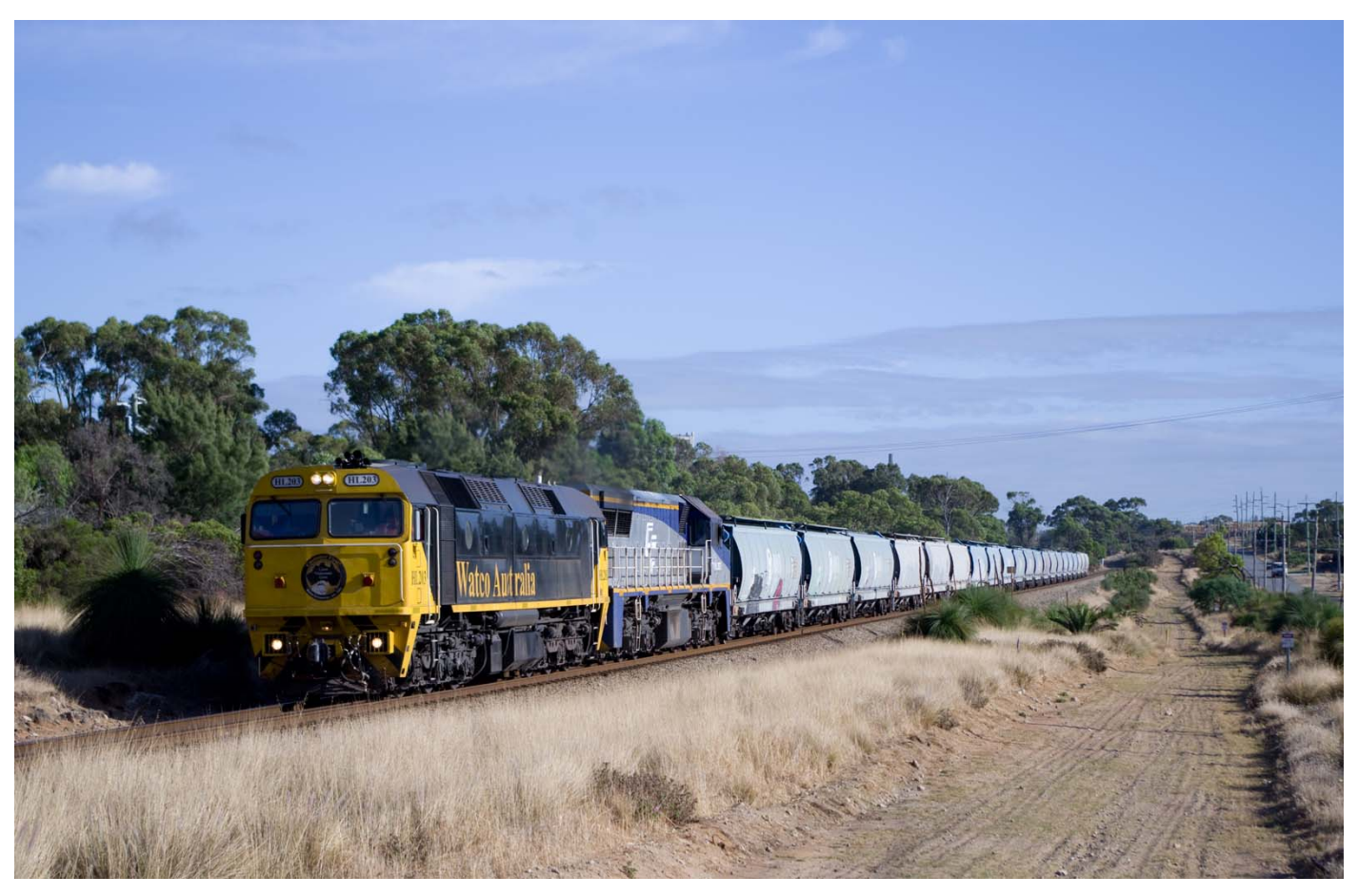
Another unusual combo: HL203 leads VL357 on S354 through Wattleup, 12^{\text{th}} February.