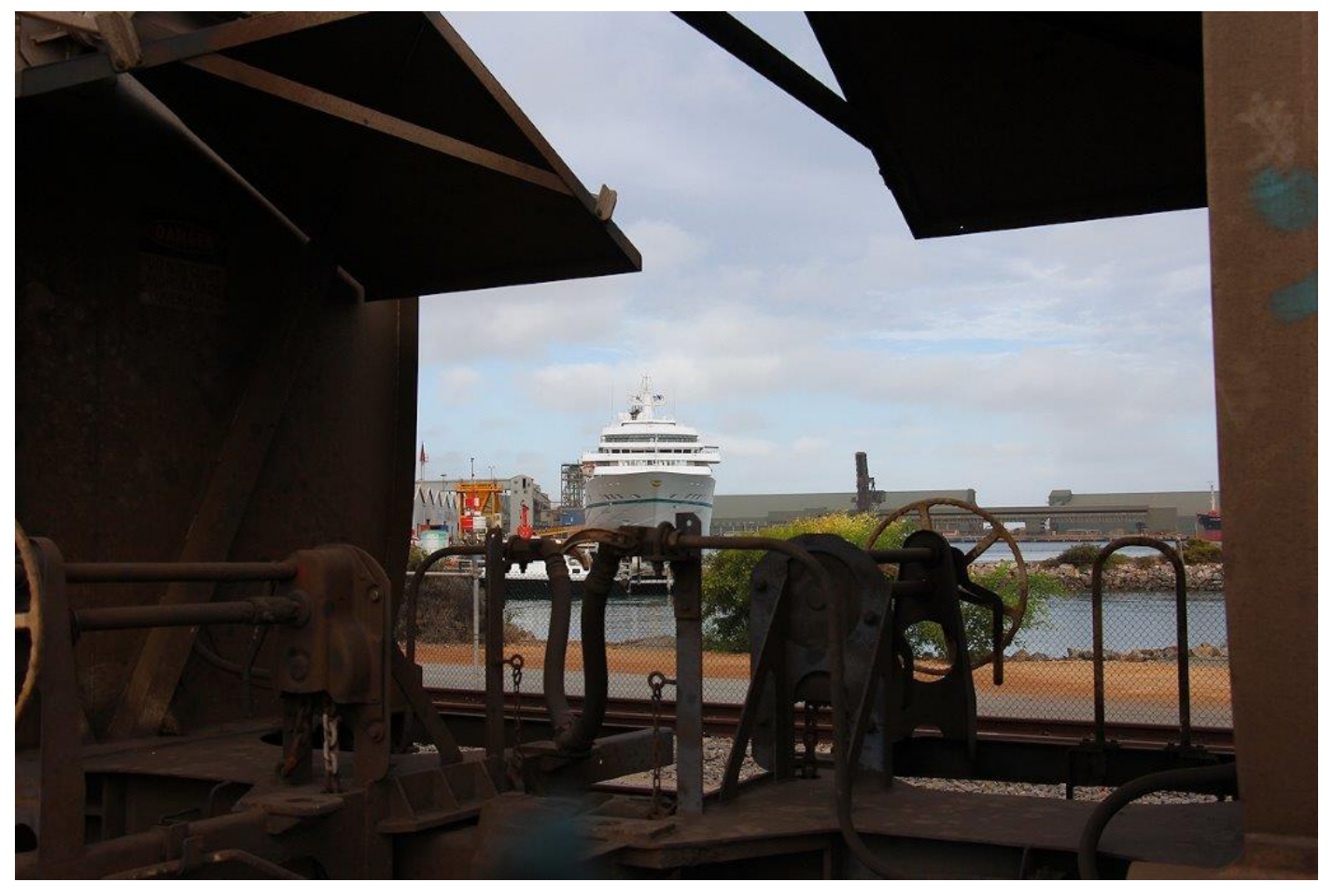
CBHN grain hoppers bracket cruise ship Amadeais at Geraldton Port, 11<sup>th</sup> February.