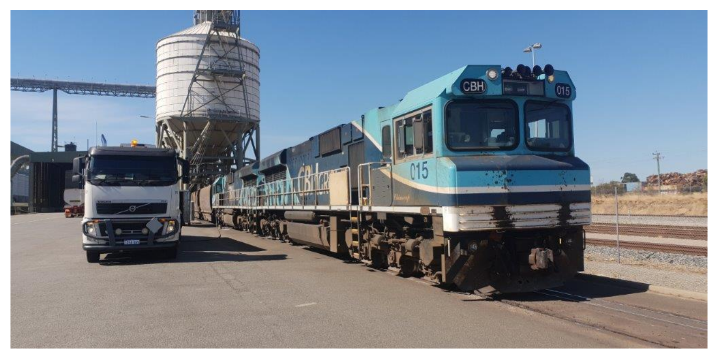
CBHs 015 & 013 on 3K44 refuel at Metro Grain, Forrestfield, 12<sup>th</sup> February. Mobile "pit stops" like this are normal for most operators nowadays, following the demise of rural servicing depots.