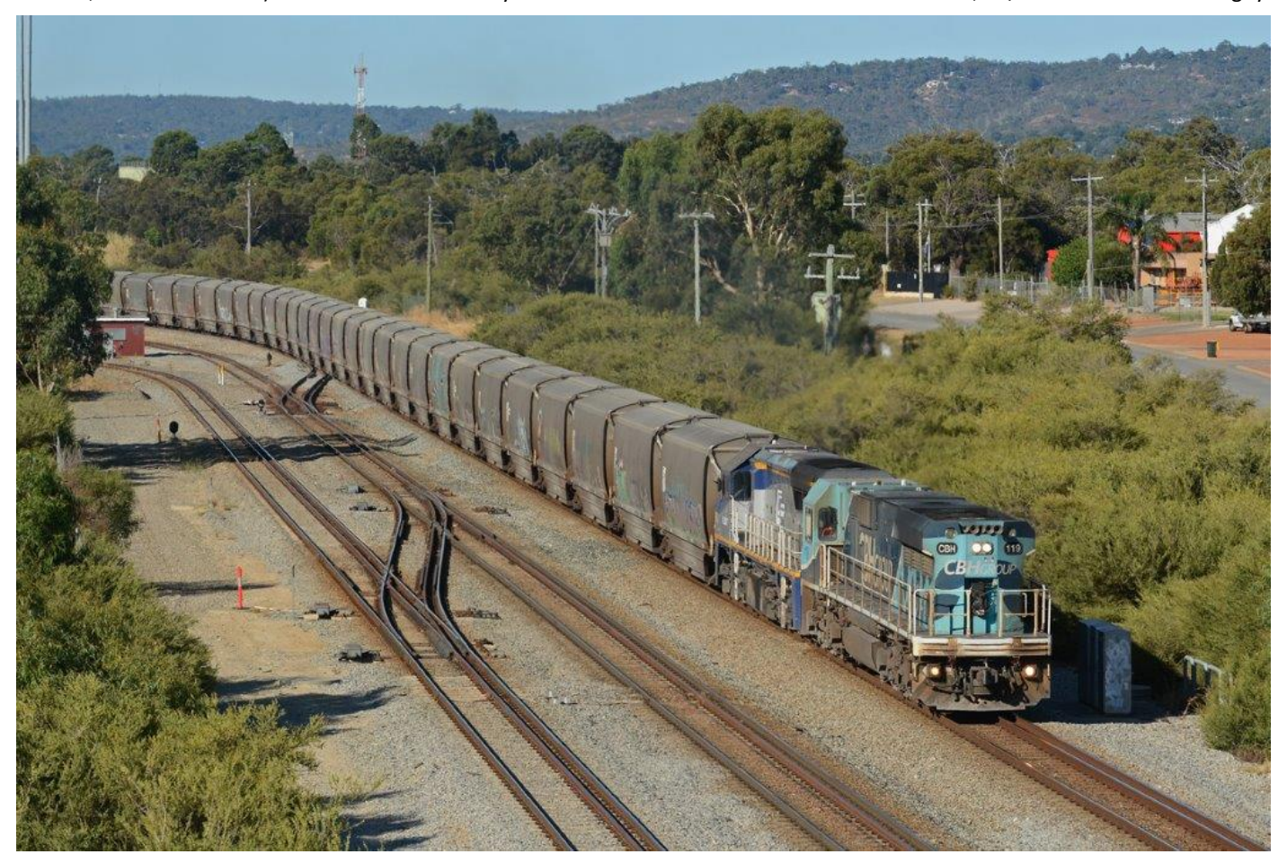
CBH119 & VL361 head 1S56 at Kewdale, 17<sup>th</sup> February.