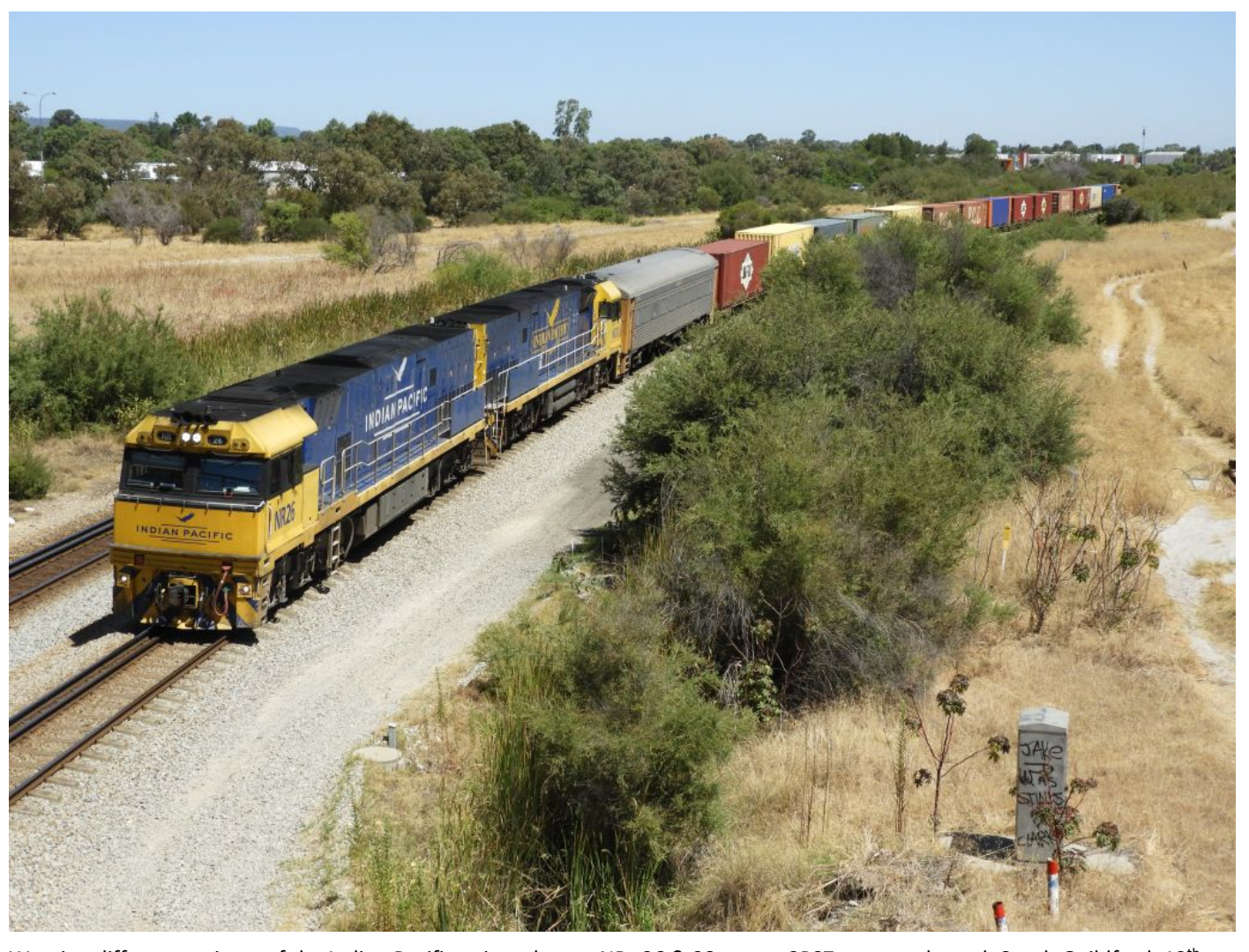
Wearing different variants of the Indian Pacific paint scheme, NRs 26 & 28 power 3PS7 express through South Guildford, 12<sup>th</sup> February.