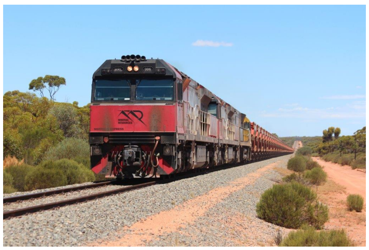
MRLs 006 & 003 lead NR78 upgrade on approach to Hampton with 1030 empty ore, 10^{\text{th}} February.