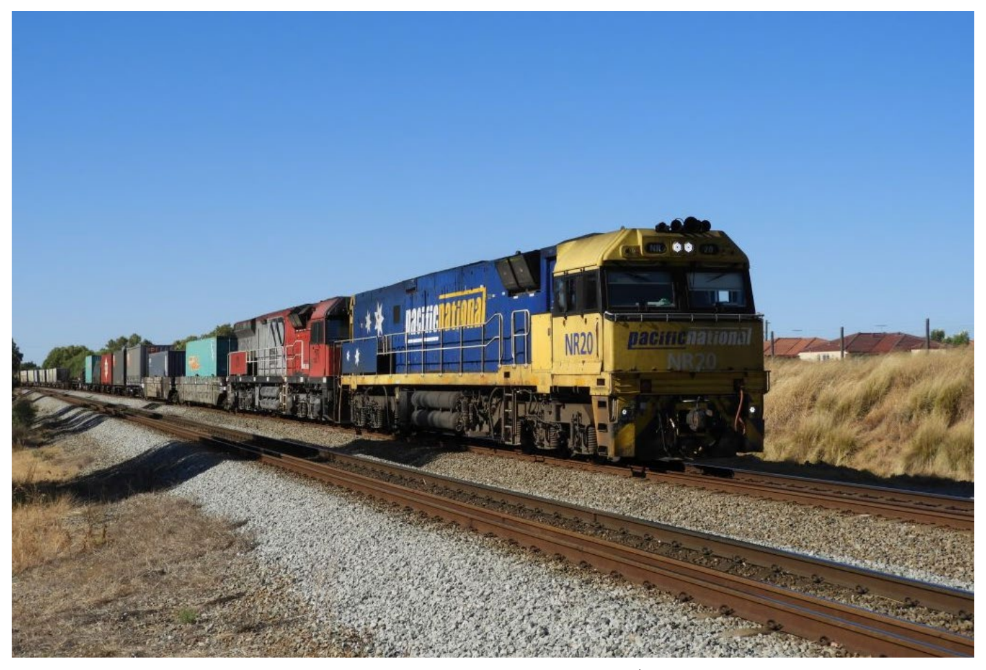
NR20 hauls MRL005 ex workshops service back to Kalgoorlie on 7PX4, Hazelmere, 9<sup>th</sup> February.