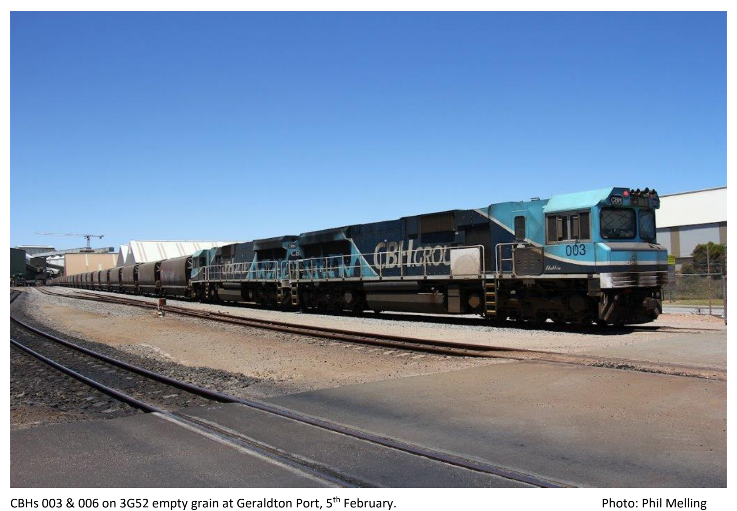
CBHs 003 & 006 on 3G52 empty grain at Geraldton Port, 5^{\text{th}} February.