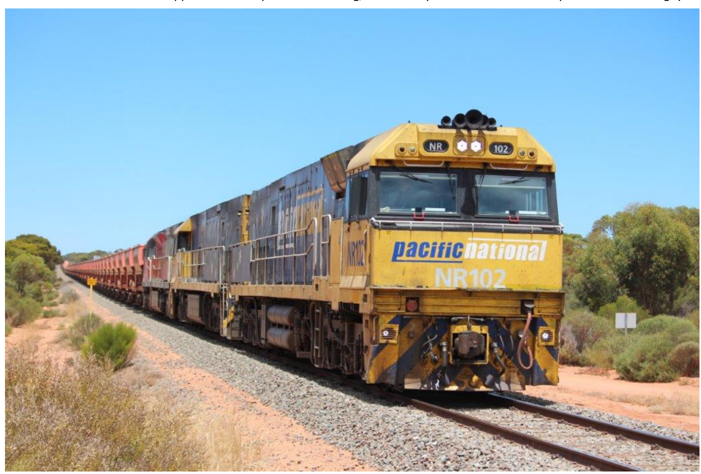
1030 empty ore with NRs 102 & 48 plus MRL001 approaches Hampton to cross 1033, 3^{\rm rd} February.