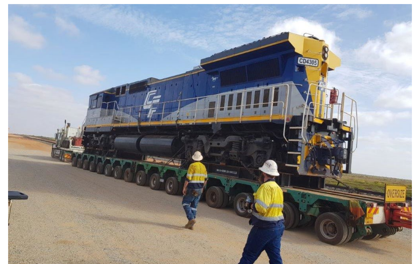
The morning after the first two CDs were sent away, CD4305 follows, 6<sup>th</sup> February.