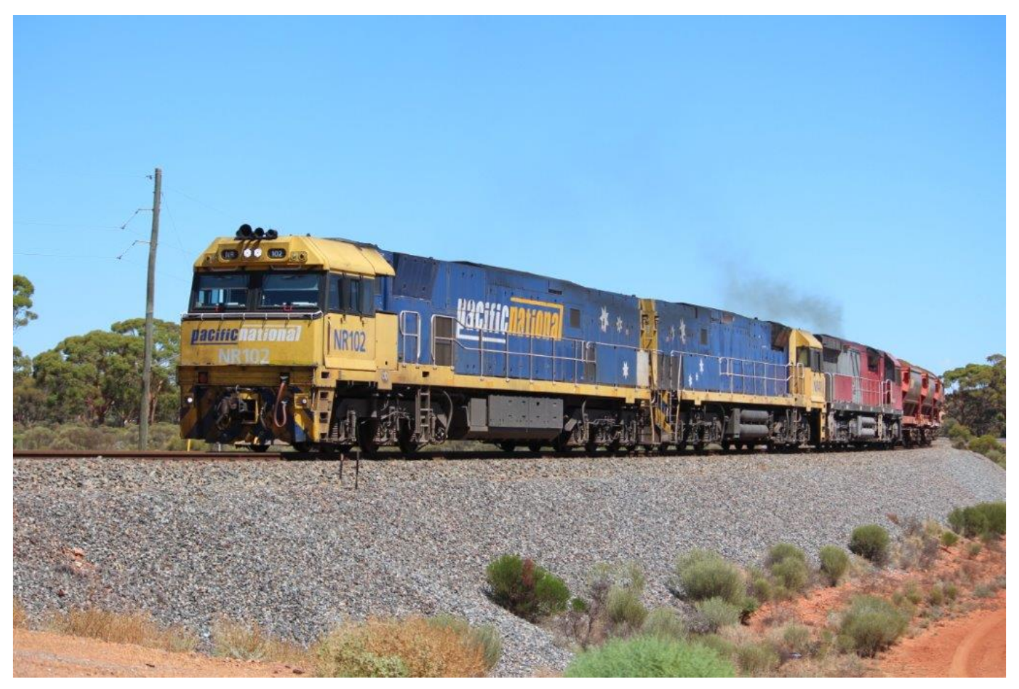
NRs 102 & 48 lead MRL001 around the Binduli triangle on 1033 loaded ore, 10^{th} February.