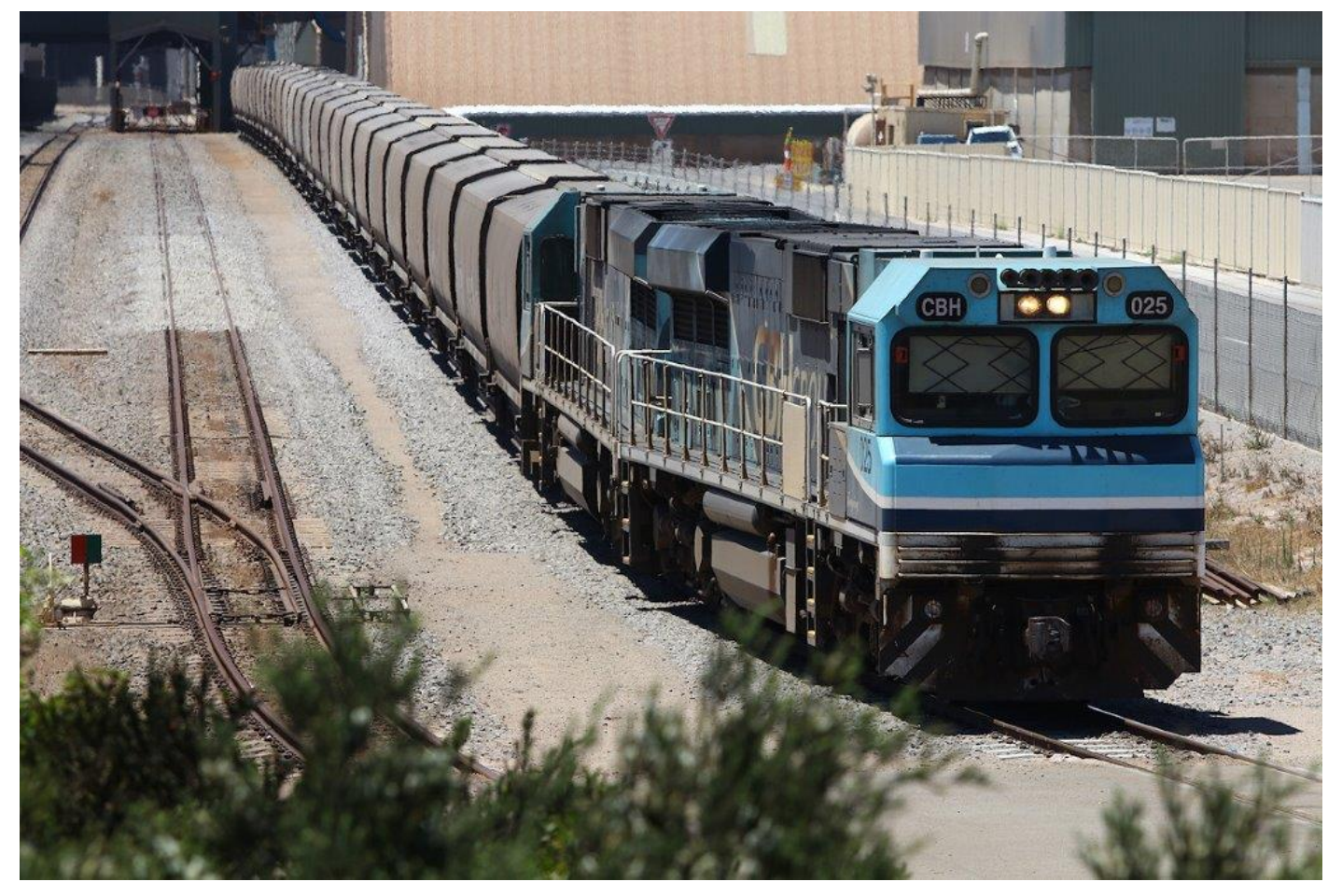
CBHs 025 & 006 head 1G52 empty grain at Geraldton Port, 10^{\text{th}} February.