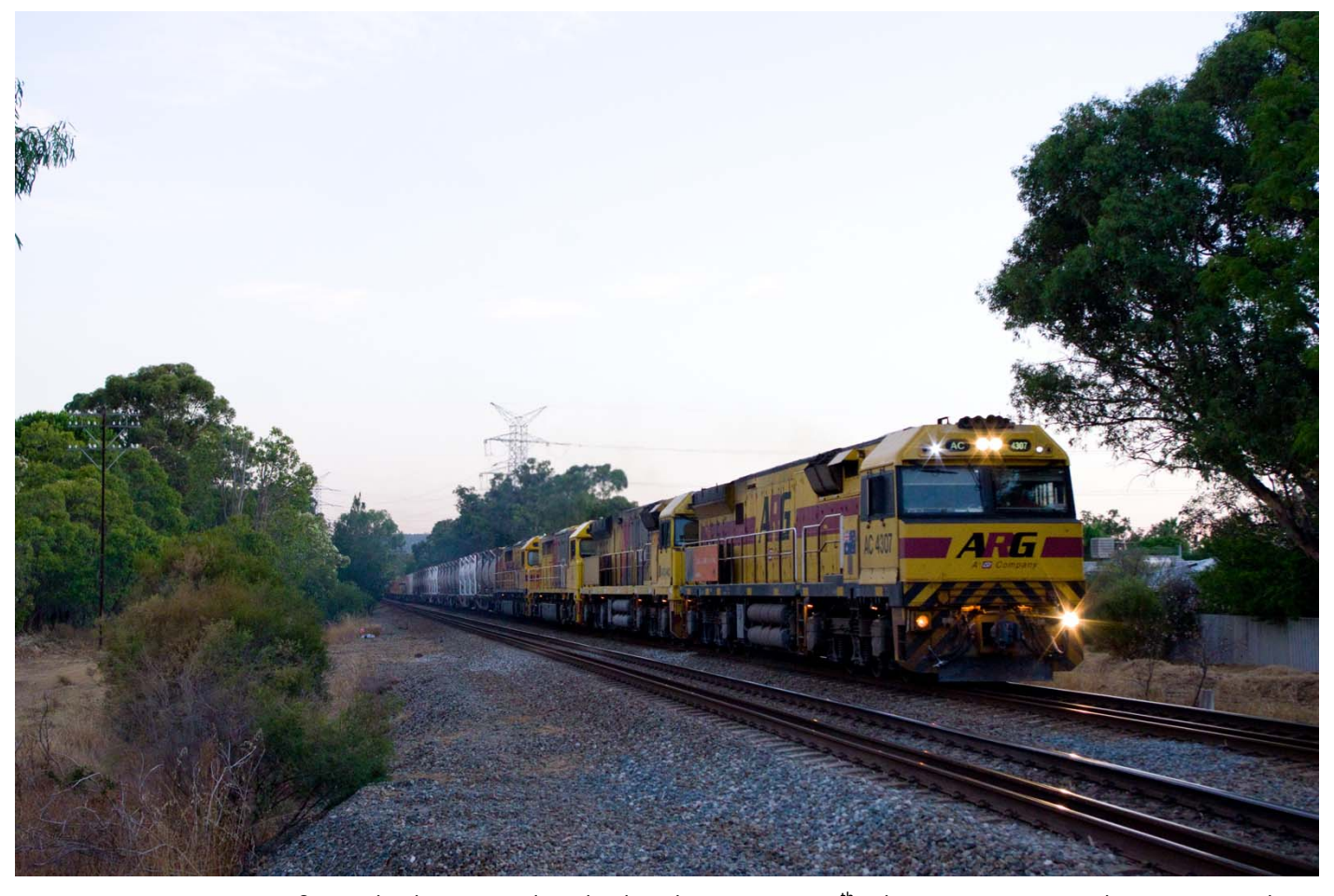
AC4307, ACB4402, Qs 4011 & 4015 haul 7025 to Kalgoorlie though Swan View, 16<sup>th</sup> February.