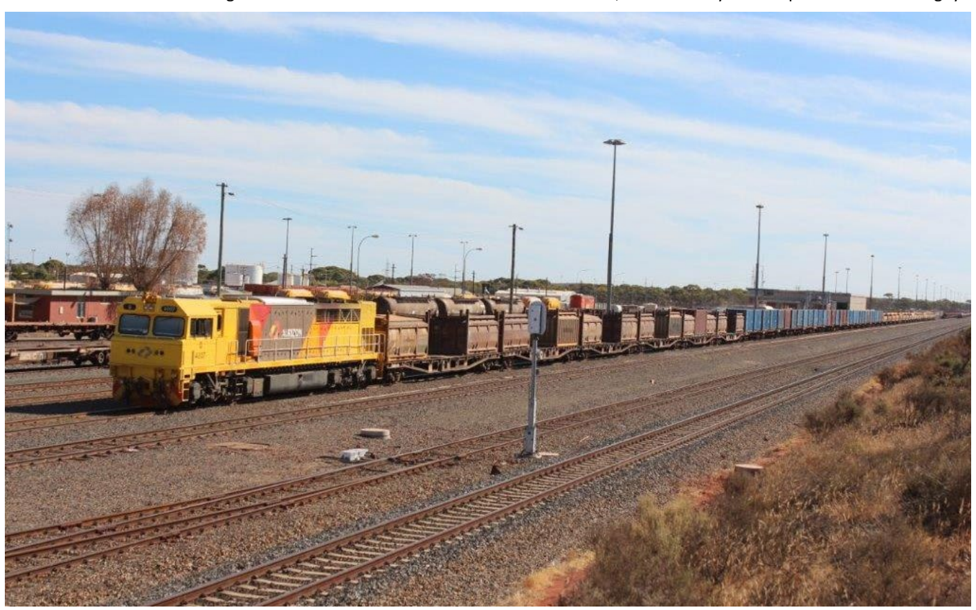
Q4007 with containers of nickel residue, containers for Lynas rare earths and WNs for nickel concentrate form a lengthy 5479 to depart for Leonora early the following morning, 13<sup>th</sup> February. 1250 metres but only 720 tonnes, so just a single loco, to return with loaded WNs only. Two locos will be sent out on 479 a night to two later to bring back the loaded Lynas plus loaded WNs.