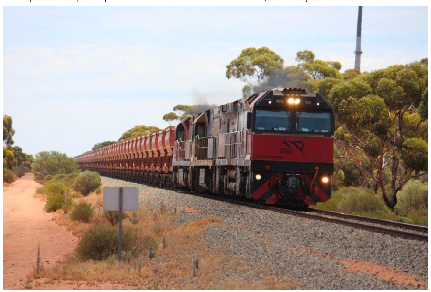
1033 enters train order territory after departing Hampton, 3^{\rm rd} February.