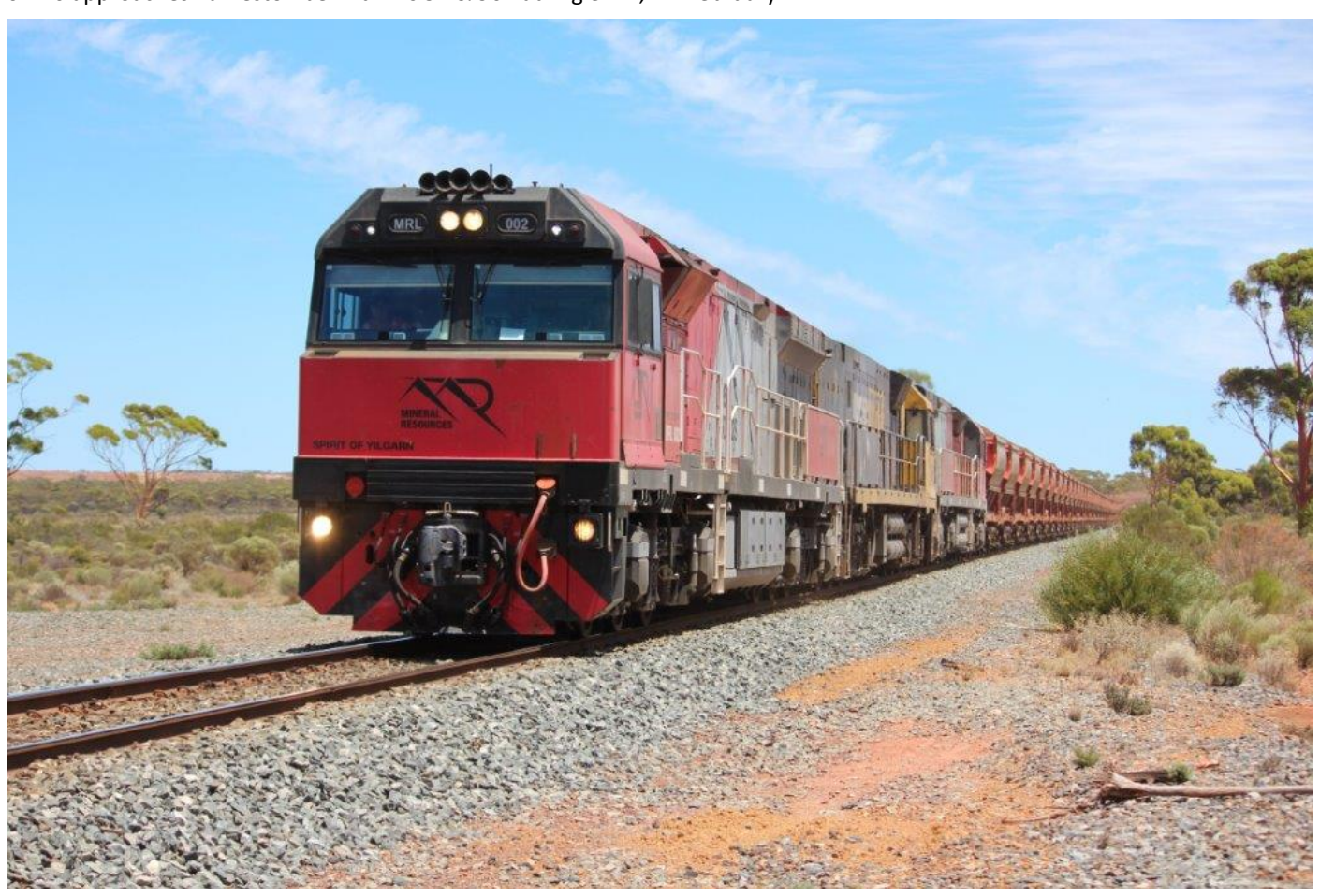
MRL002, NR94 & MRL004 haul 1033 loaded ore between Binduli and Hampton, 3<sup>rd</sup> February.