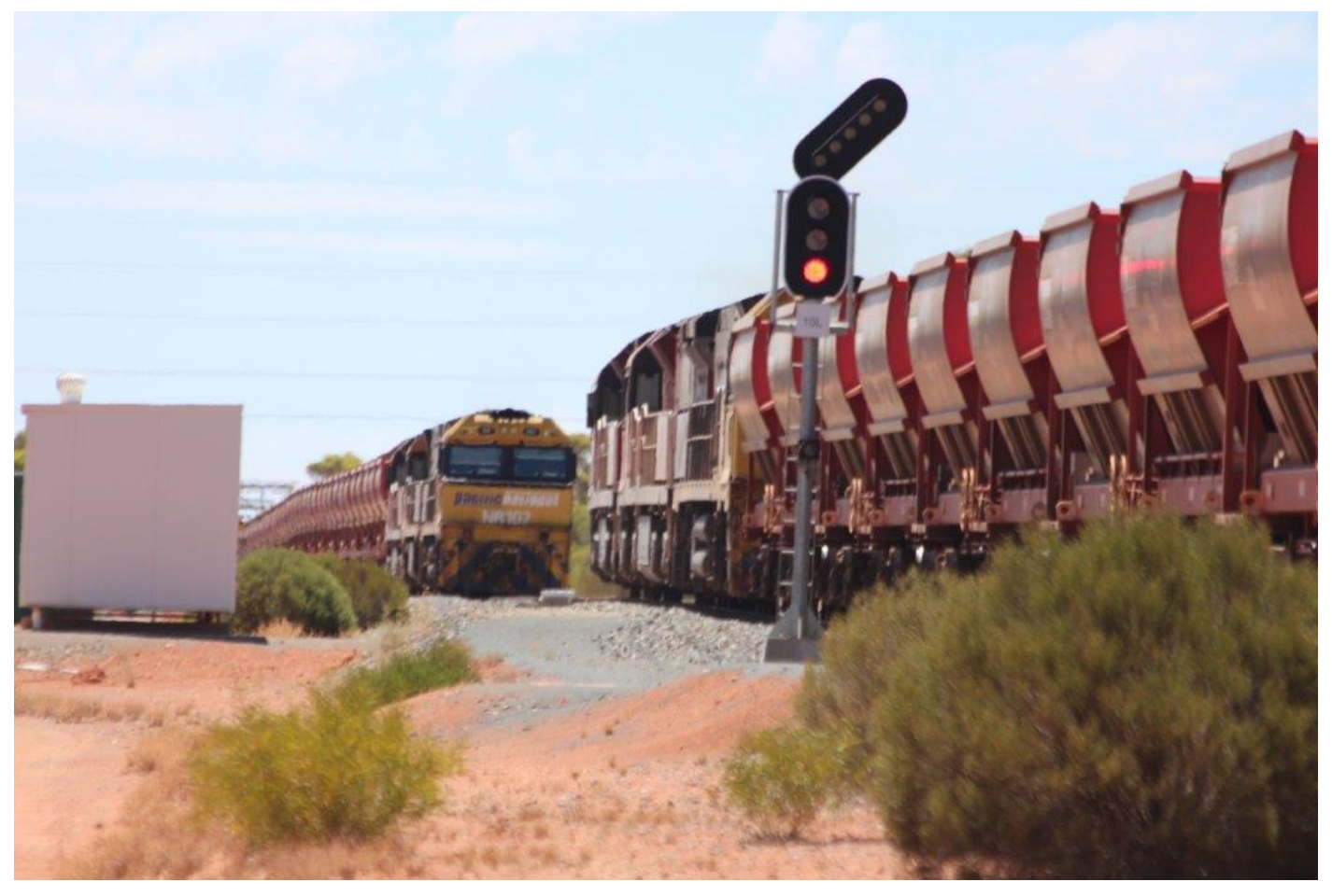
1033 waits on the main as 1030 veers onto the loop at Hampton, 10^{\text{th}} February.