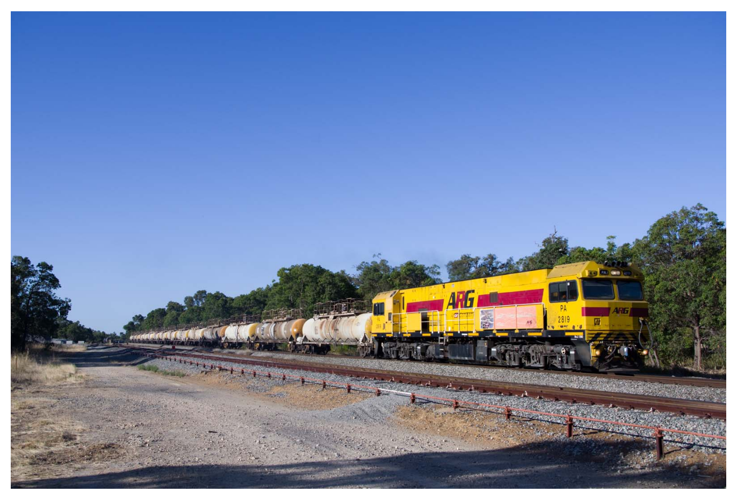
Former Queensland 2800 class PA2819 runs 1239 through Keysbrook, 17<sup>th</sup> February.