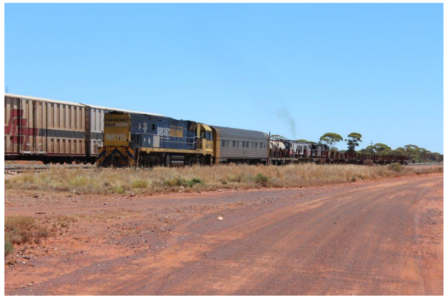
SCT008 & CSR009 lead 5MP9 past NR115 stabled with empty ARTC rail set 2, Parkeston, 9<sup>th</sup> February.