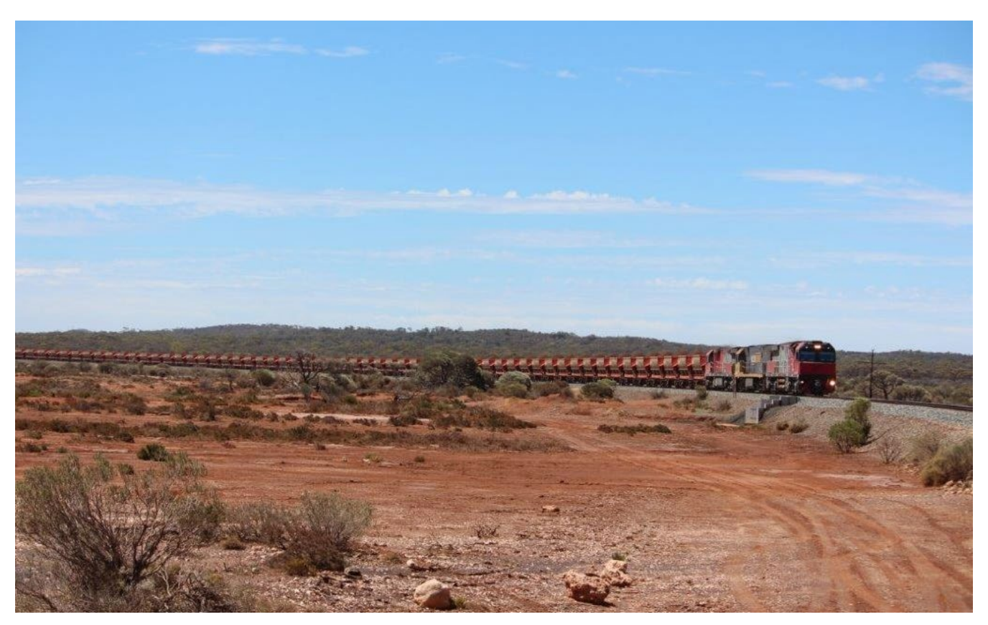
1033 races through the "badlands" near West Kambalda, 3<sup>rd</sup> February.