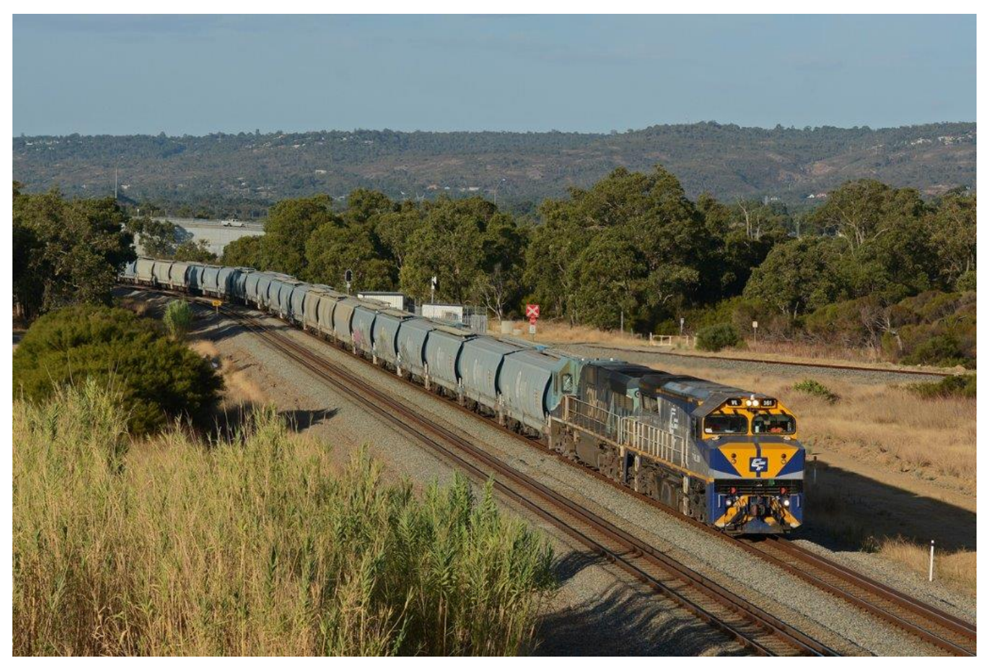
VL361 leads CBH120 on 7S56 grain at Kenwick, 16<sup>th</sup> February.