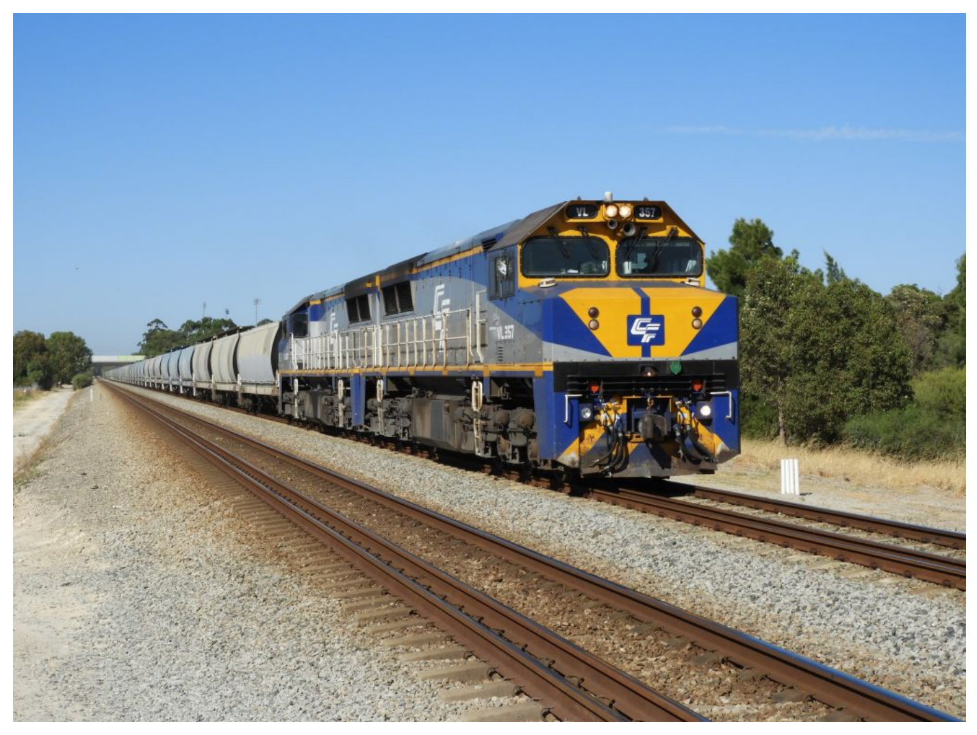
VLs 357 & 361 pass through Thornlie with 6S51 empty NGXH grain hoppers, 1st February.