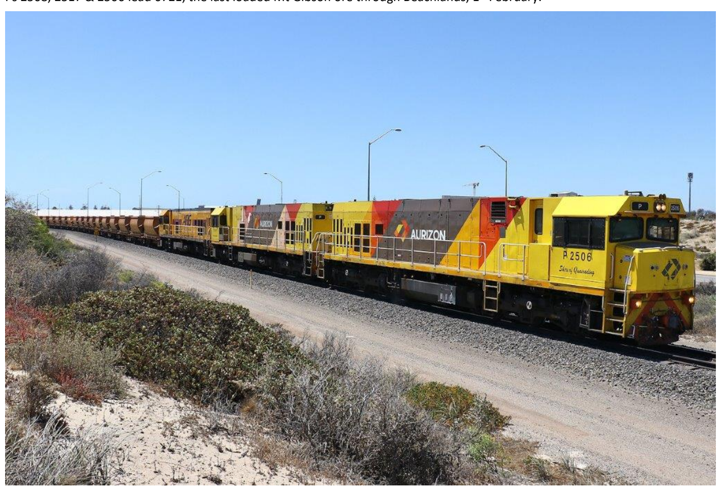
Ps 2506, 2517 & 2508 pass Beachlands with the last empty Mt Gibson working (6722) 1st February.