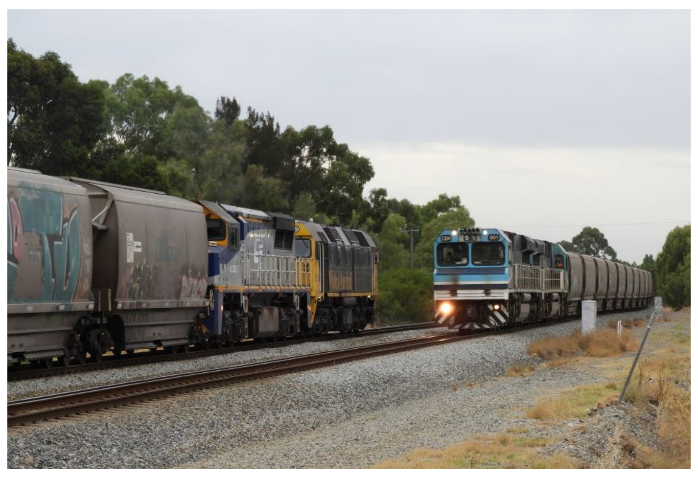
HL203 & VL357 on 4S56 cross CBHs 001 & 004 on 4K53, South Guildford, 13<sup>th</sup> February.