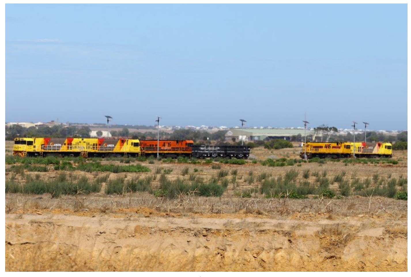
Ps 2513, 2506, 2503, 2501 & 2505 stored at Narngulu East, 10^{\text{th}} February.