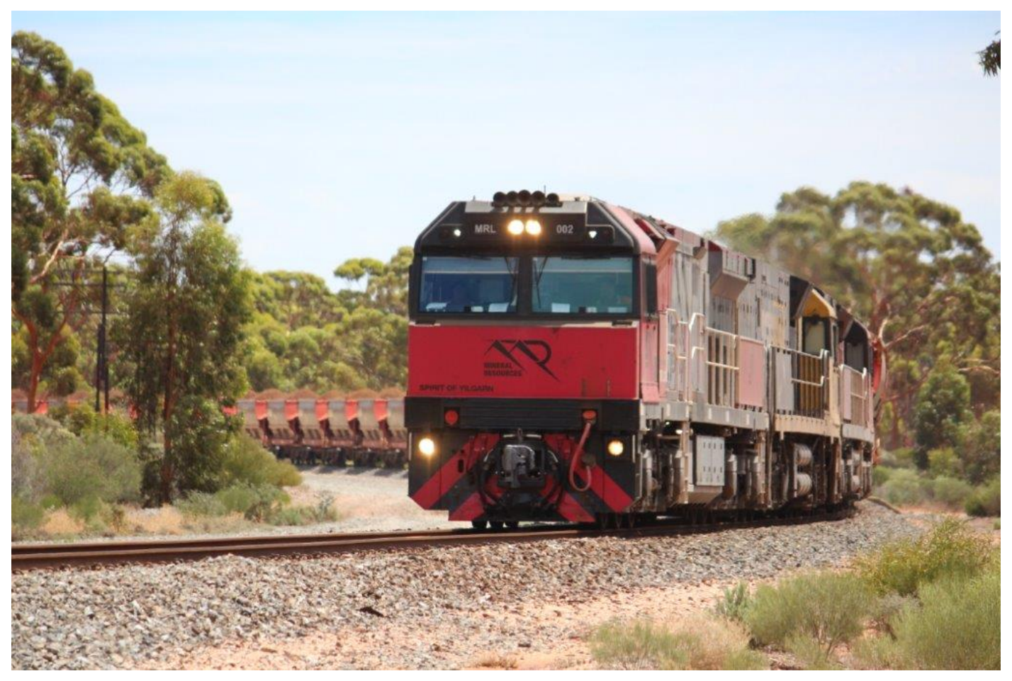
1033 ore rounds the curve on approach to Hampton ballast siding, \mathbf{3}^{\text{rd}} February.