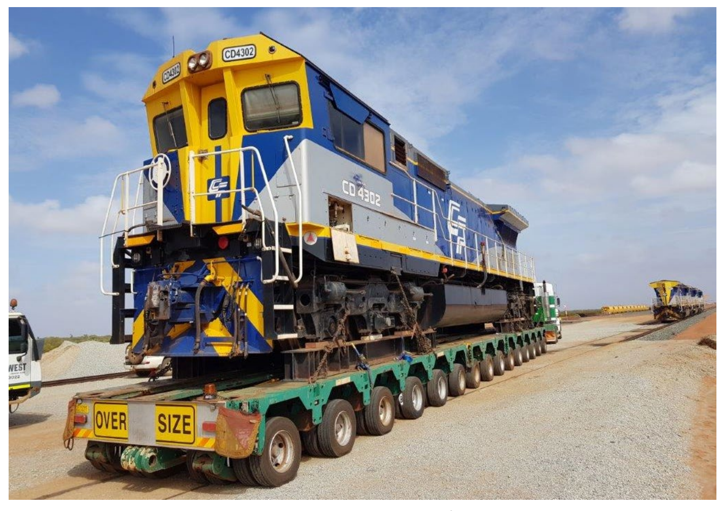
With her lease to Roy Hill completed, CD4302 is all loaded up and ready to transfer back to storage near the speedway, Port Hedland, while her three sisters await the same fate, 5<sup>th</sup> February.