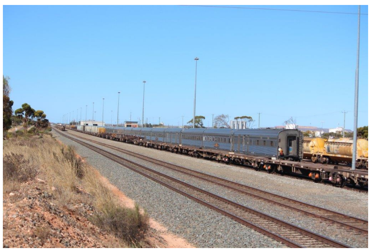
1PA8 Indian Pacific, now empty, stabled in West Kal yard, beside 7PX4 and 1446 fuel (distant left), 18<sup>th</sup> February.