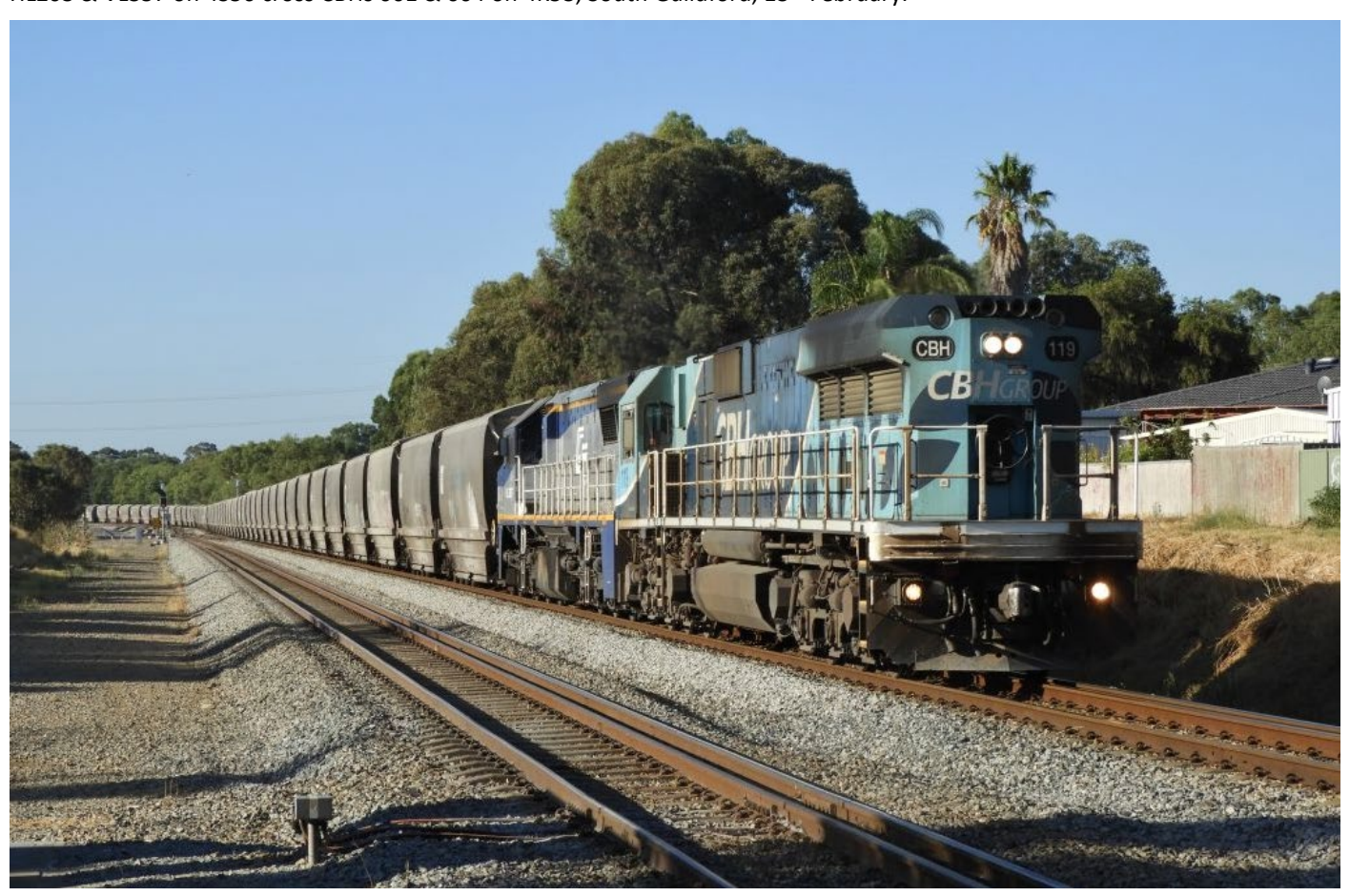
CBH119 leads VL361 on 6S56 grain through Hazelmere, 15<sup>th</sup> February.