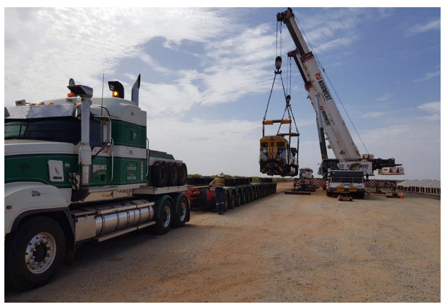
CD4303 is lifted for loading onto the float, for transfer off the Roy Hill site, 5^{\text{th}} February.