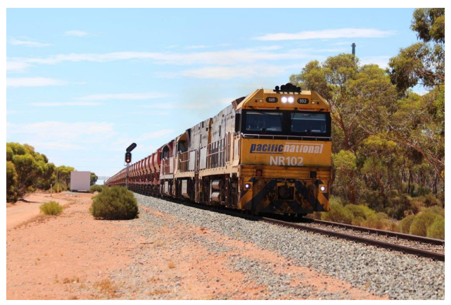
The cross now completed, 1033 resumes its journey to Esperance, 10^{\text{th}} February.