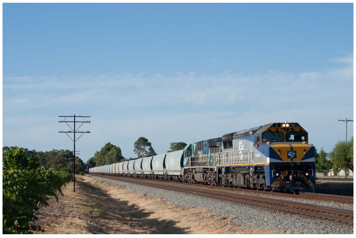
VL361 leads CBH120 on 7S56 at Herne Hill (above) and approaching Forrestfield (below), 16<sup>th</sup> February.