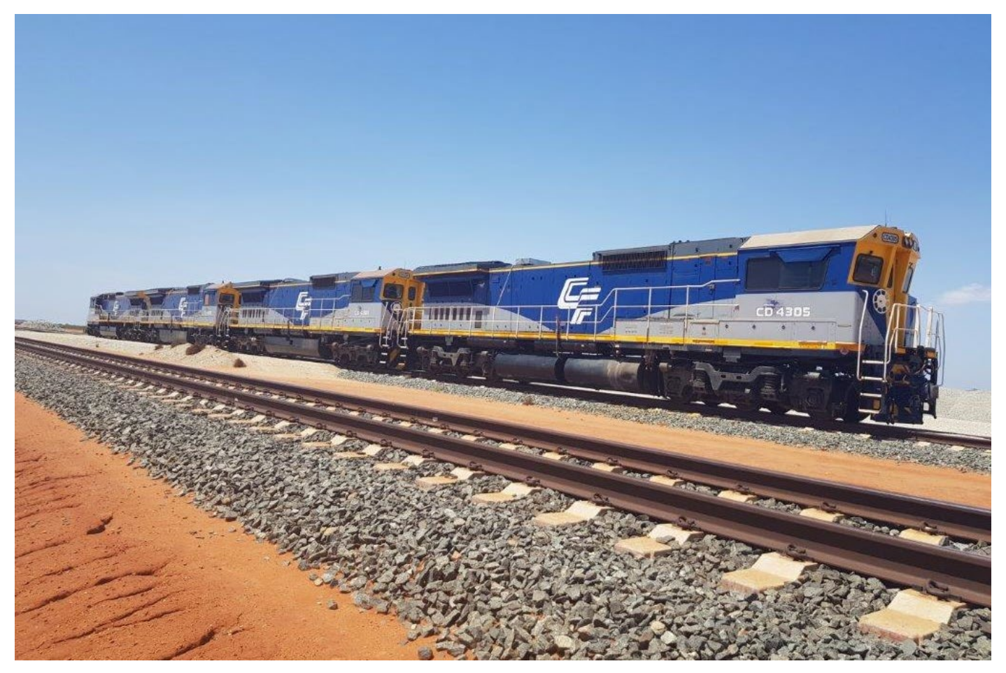
CFCLA's four CD dash-8s were off-hired by Roy Hill, stabled on 1st February.