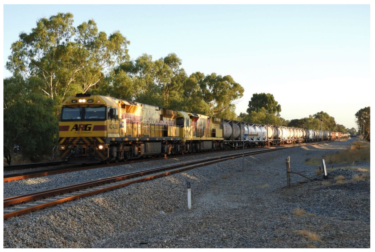
AC4301 & ACC6032 haul 6025 Kalgoorlie freight through evening shadows, Woodbridge, 15<sup>th</sup> February.