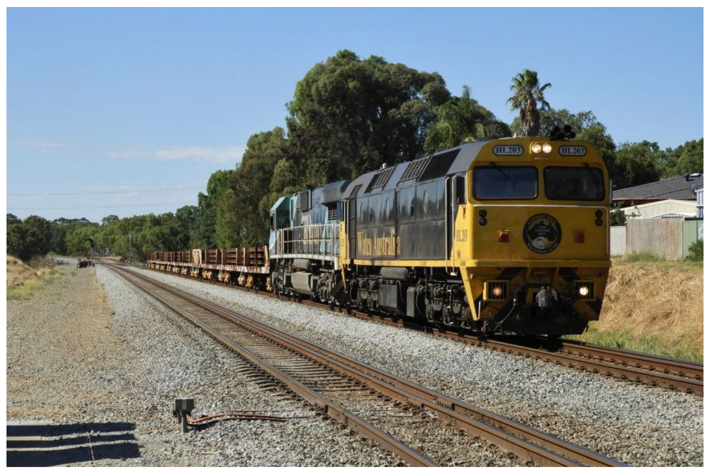
The unusual combo of HL203 & CBH121 work 6RT2 rail train to Kwinana through Hazelmere, 8^{th} February.