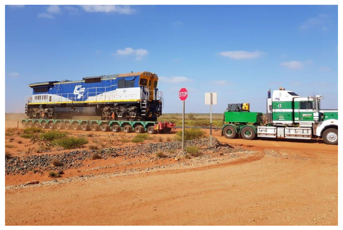
CD4301 on transfer back to Port Hedland after the lease to Roy Hill ended, 6<sup>th</sup> February.