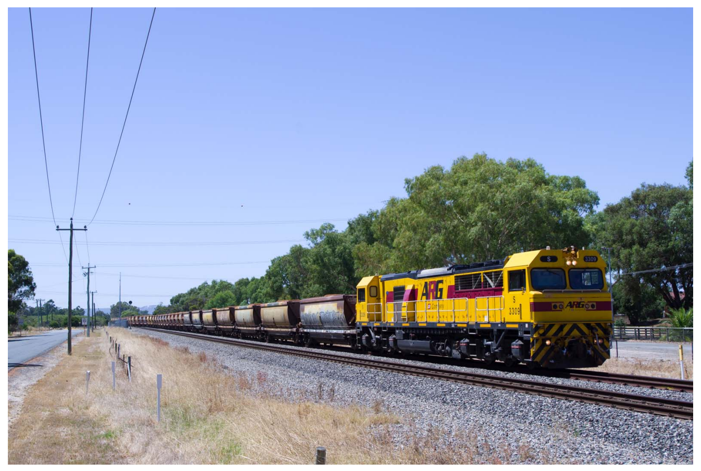
S3309 works 6936 through Wellard, 1st February.