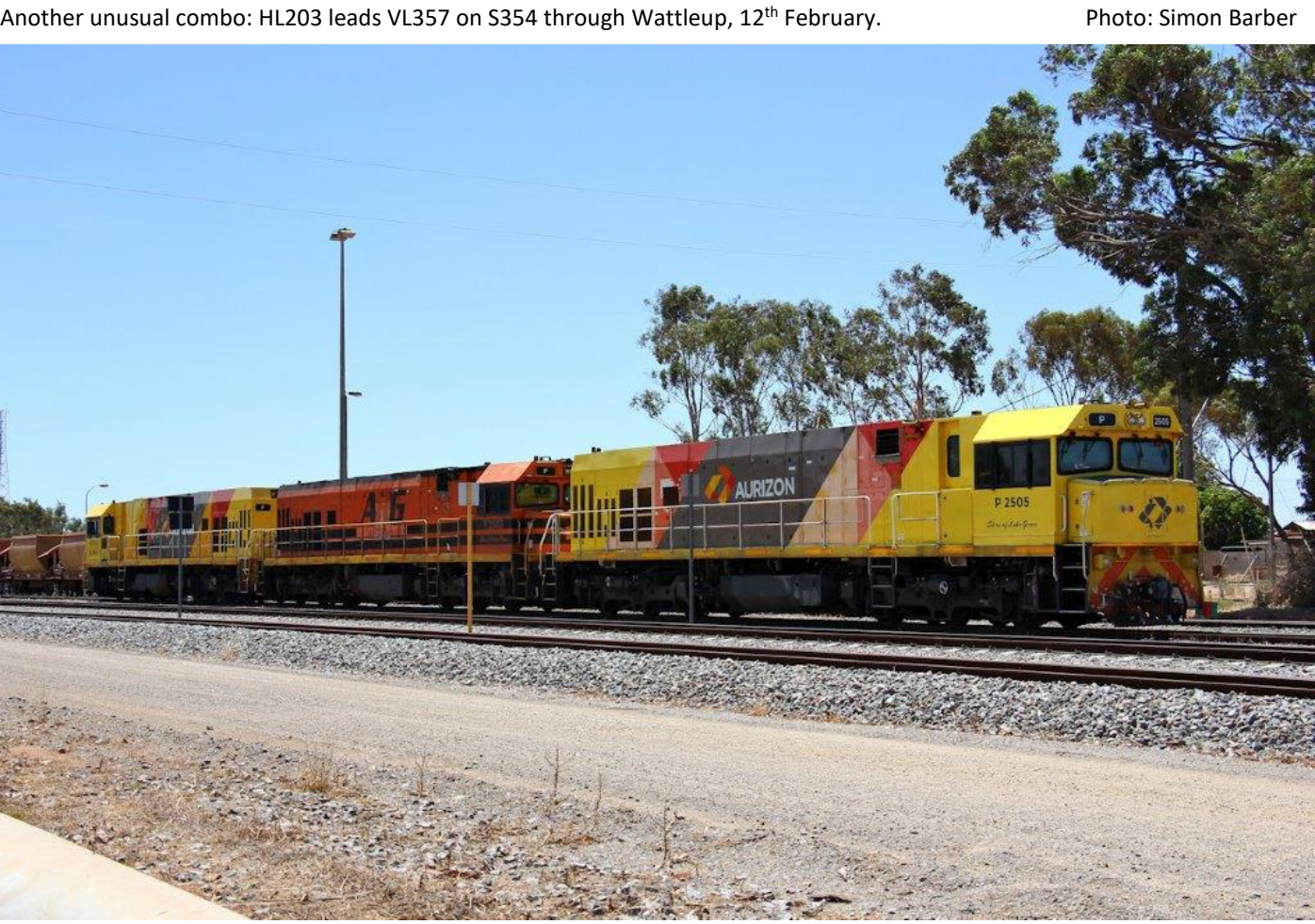
Ps 2505, 2503 & 2513 stored at Narngulu, 12^{th} February.