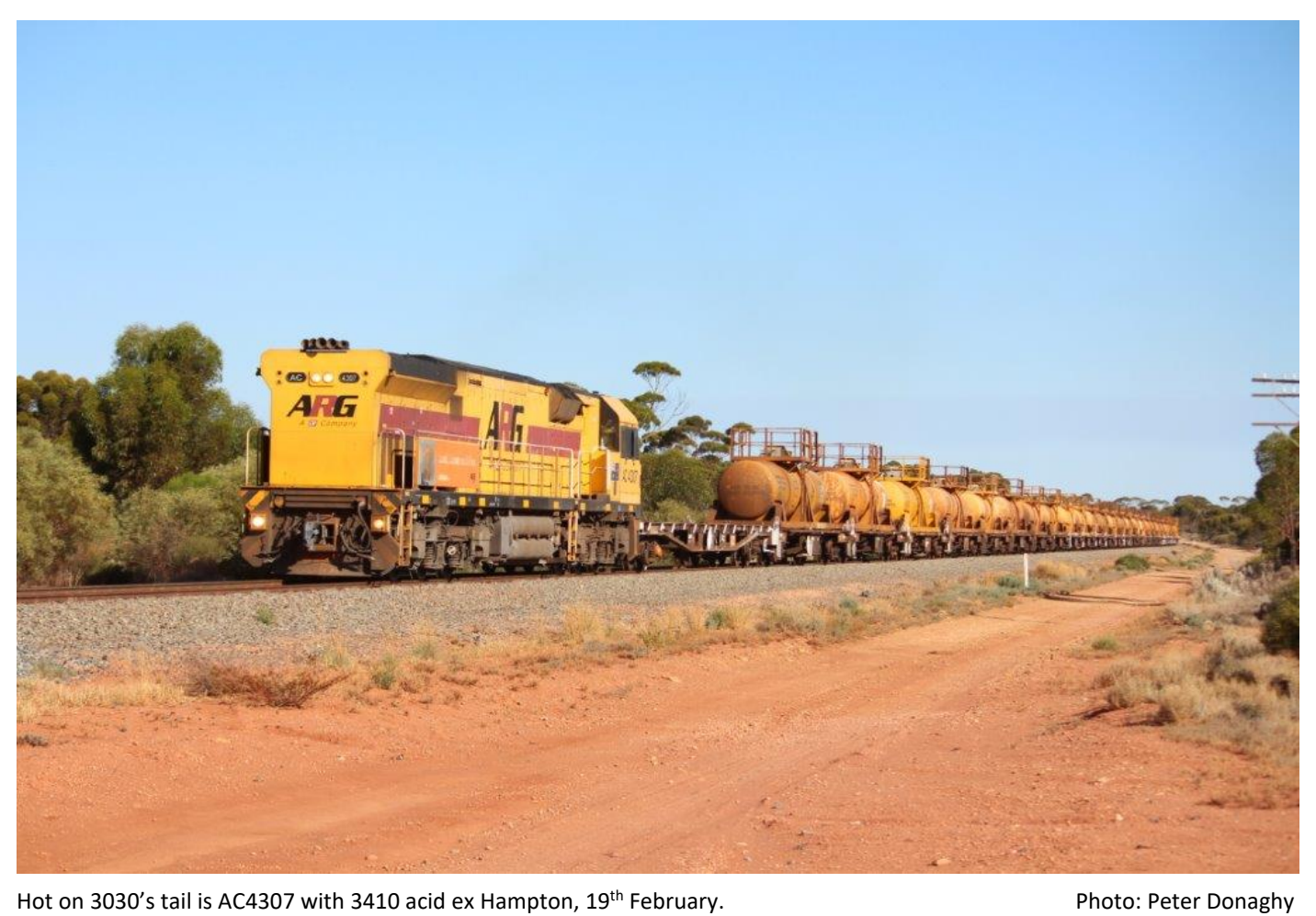
Hot on 3030's tail is AC4307 with 3410 acid ex Hampton, 19^{\text{th}} February.