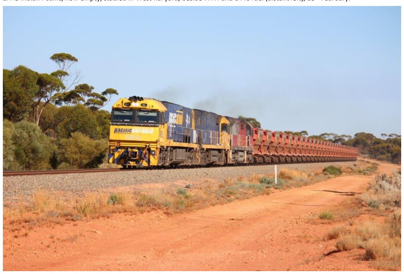
NRs 32 & 48 with MRL001 on 3030 empty ore approaching Binduli, 19^{\text{th}} February.