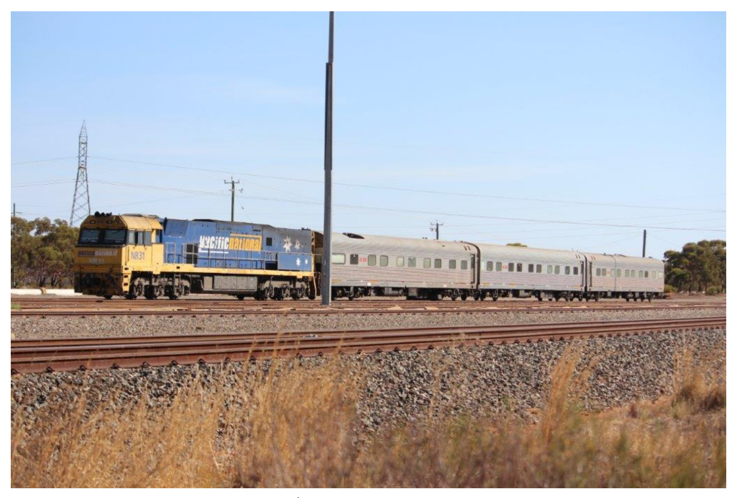
NR31 and the AK cars rest in West Kal yard, 25^{\text{th}} February.