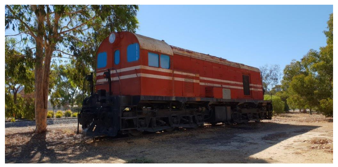
F41 on a plinth at Moora, 24^{\text{th}} February.