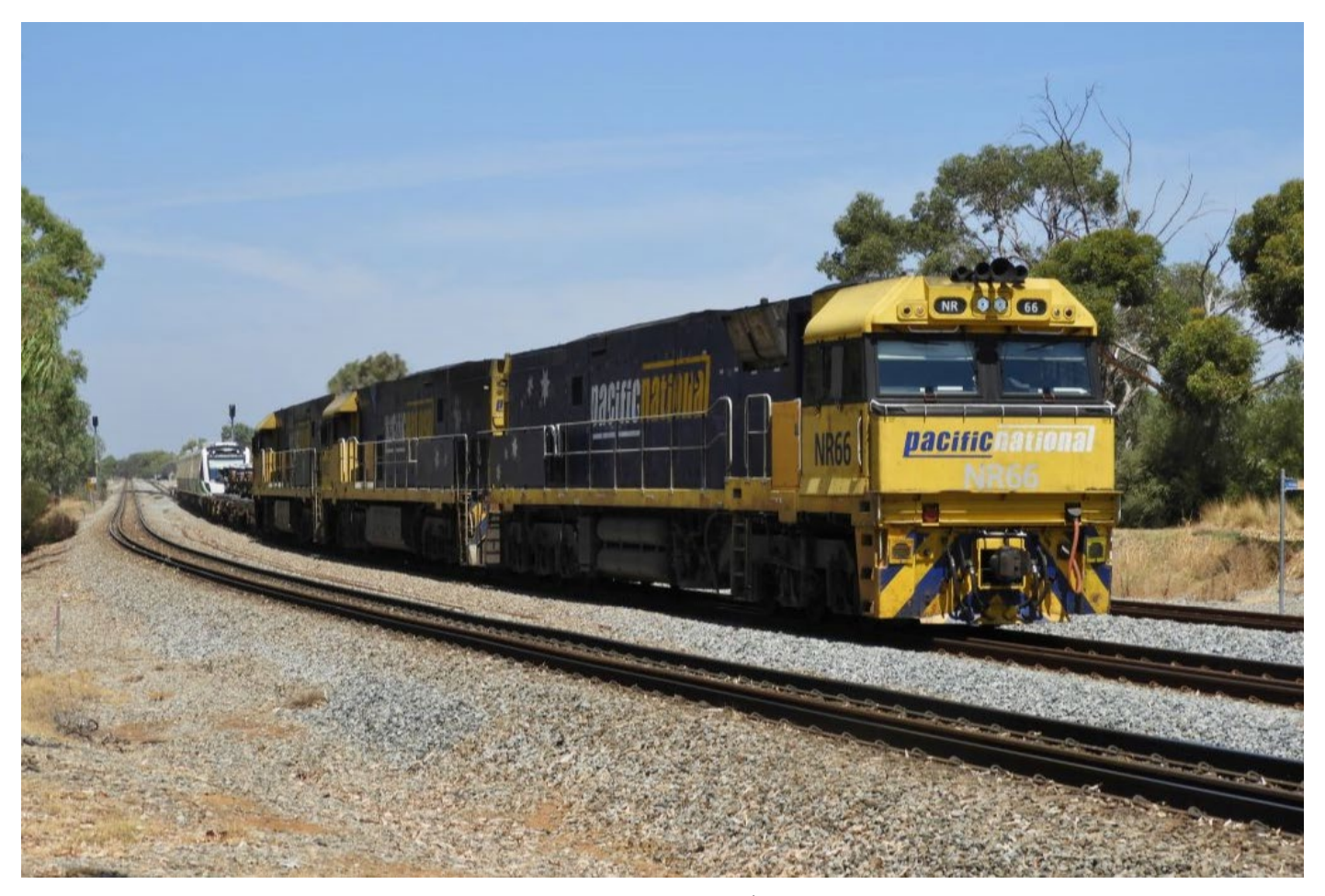
NRs 66, 23 & 39 haul EMU set 125 as 5P31 to PTA Woodbridge. 28<sup>th</sup> February.