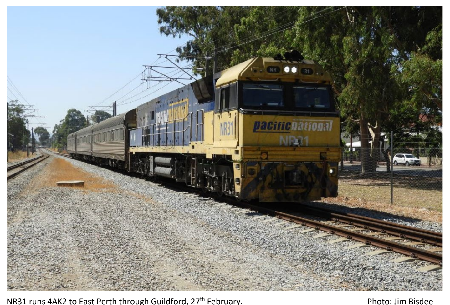
NR31 runs 4AK2 to East Perth through Guildford, 27<sup>th</sup> February.