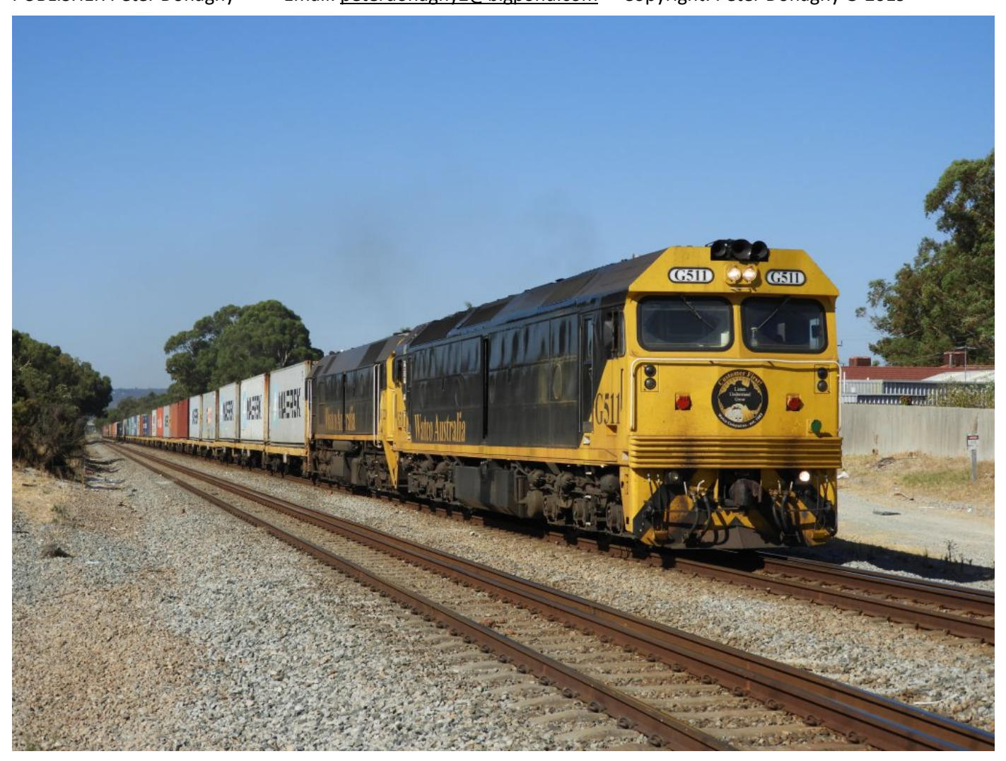
G511 & FL220 run 4146 port shuttle through Thornlie, 20th February.

NUMBER 2_2 A free monthly photo e-Mag of railway happenings in WA during February 2019 PUBLISHER Peter Donaghy Email: <a href="mailto:peterdonaghy2@bigpond.com">peterdonaghy2@bigpond.com</a> Copyright: Peter Donaghy © 2019