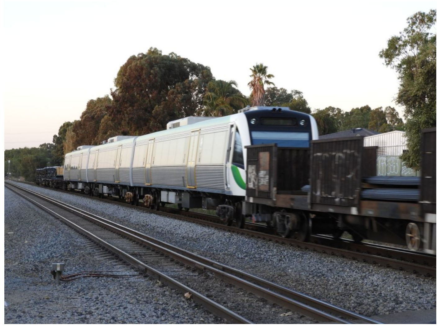
New PTA B set #125 on the rear of 5MP2, Hazelmere, 24<sup>th</sup> February.