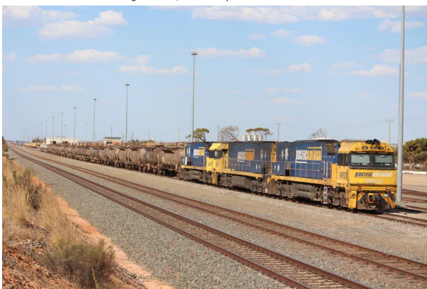
NRs 121 and 41 transfer NR52 to Esperance ore on 4445 empty fuel, 27<sup>th</sup> February.