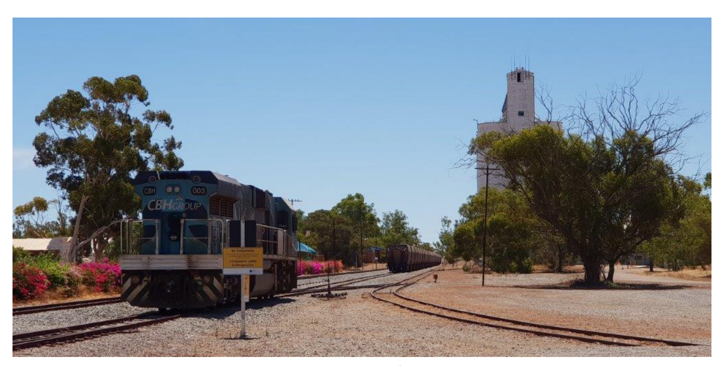
CBH003 and a rake of grain hoppers stabled at Three Springs, 24<sup>th</sup> February.