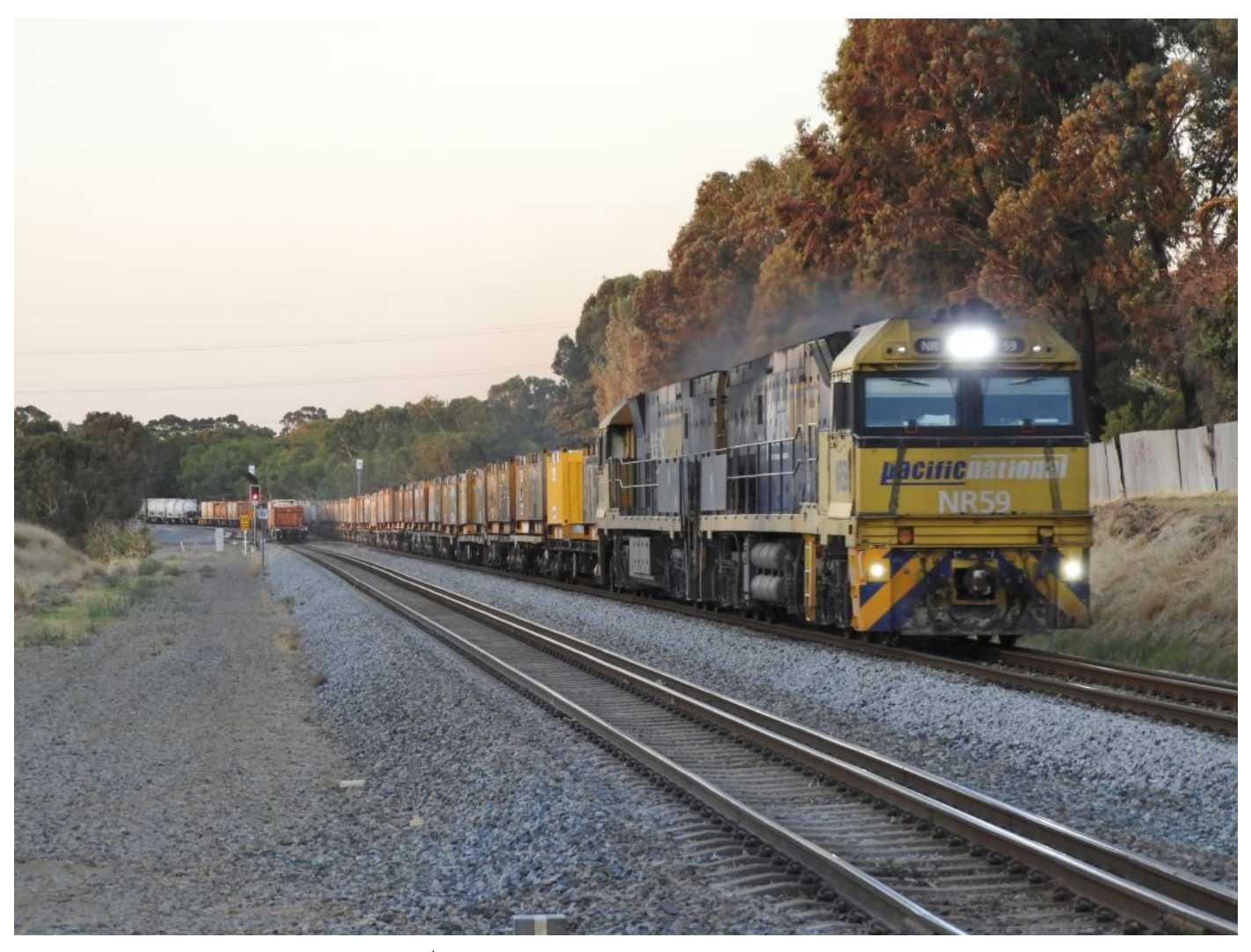
NRs 59 & 82 with 5MP2, Hazelmere, 24<sup>th</sup> February.