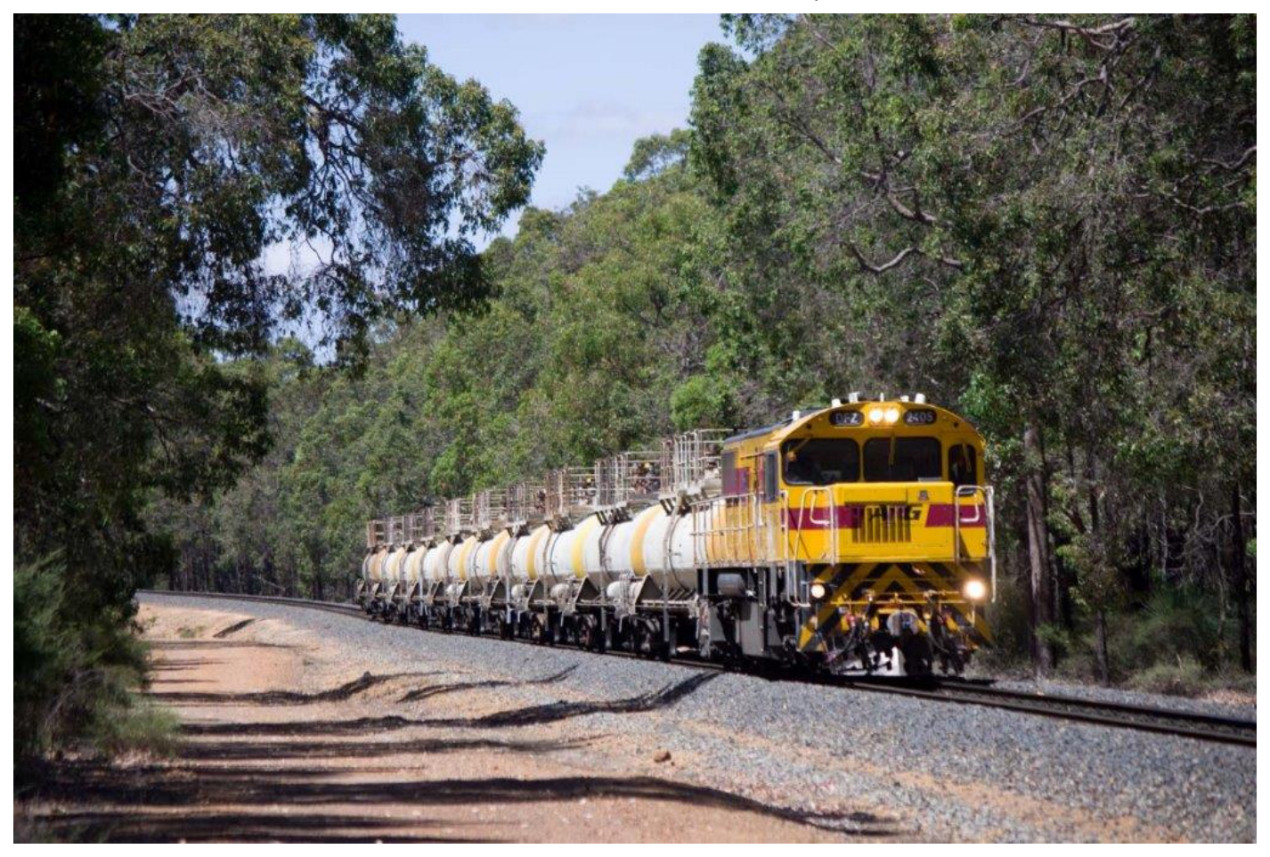
DFZ2405 on 6854 passes through Hamilton, 22^{nd} February.