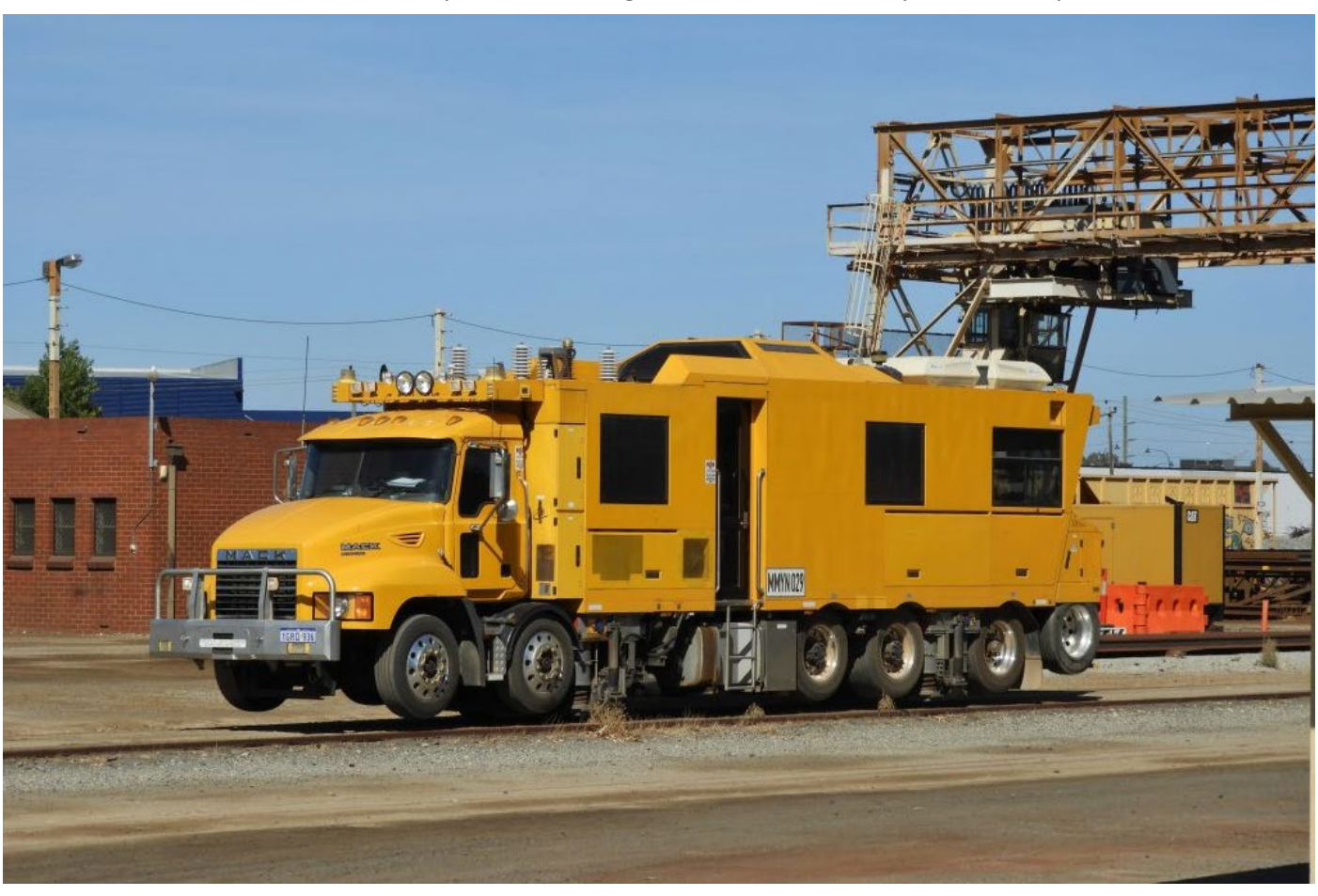
Road-rail MMY029 Sperry rail flaw detection vehicle, Flashbutt yard, Midland, 24<sup>th</sup> February.