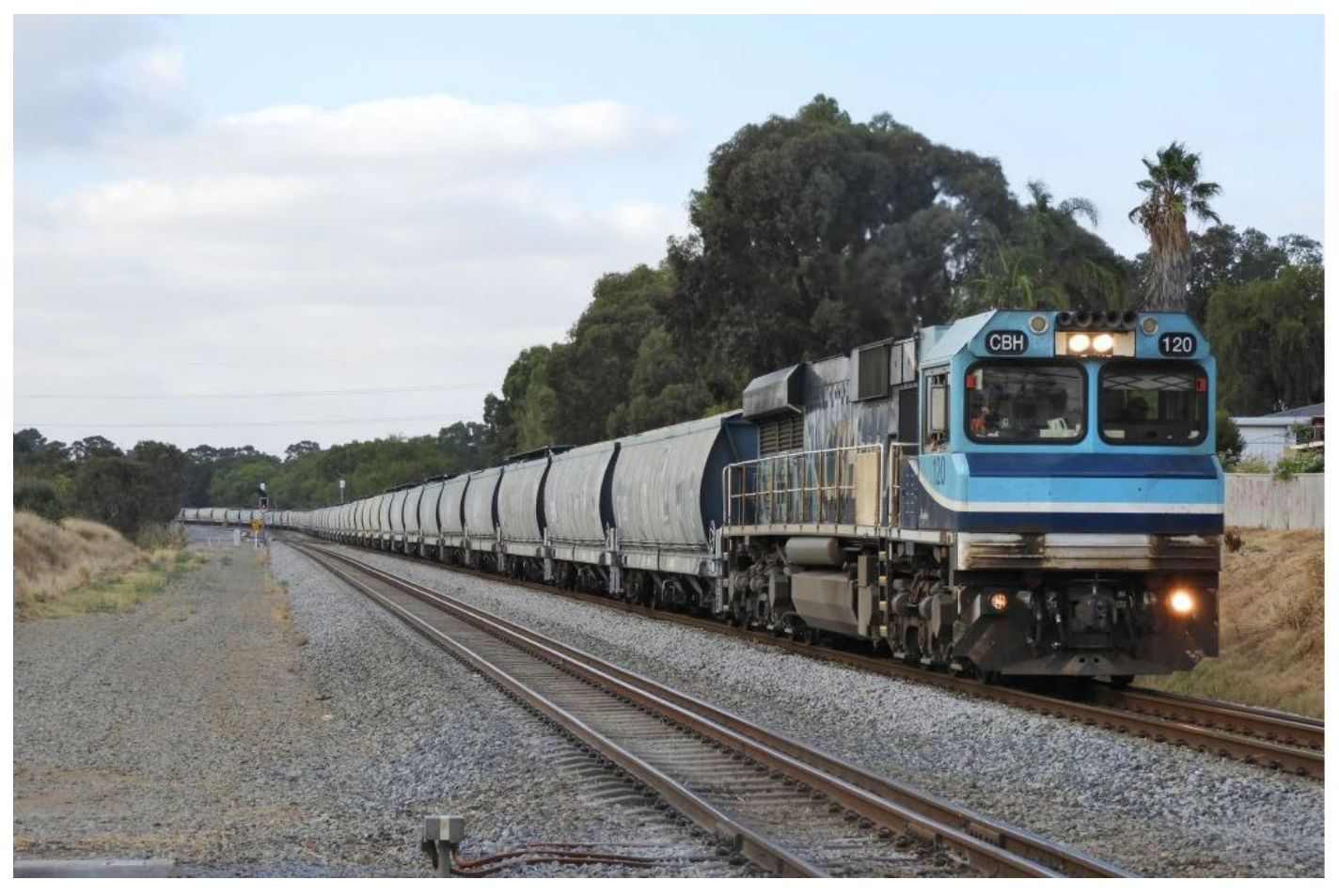
Solo CBH120 on the leased NGXH rake forms 5S56, Hazelmere, 21st February.