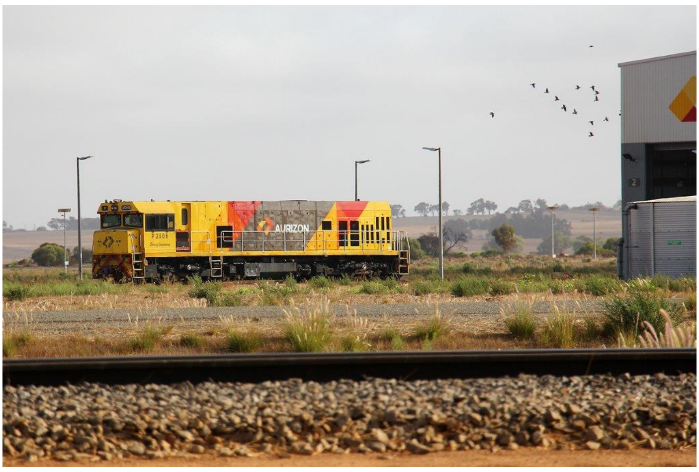
P2506 stored at Narngulu East, 26^{th} February.