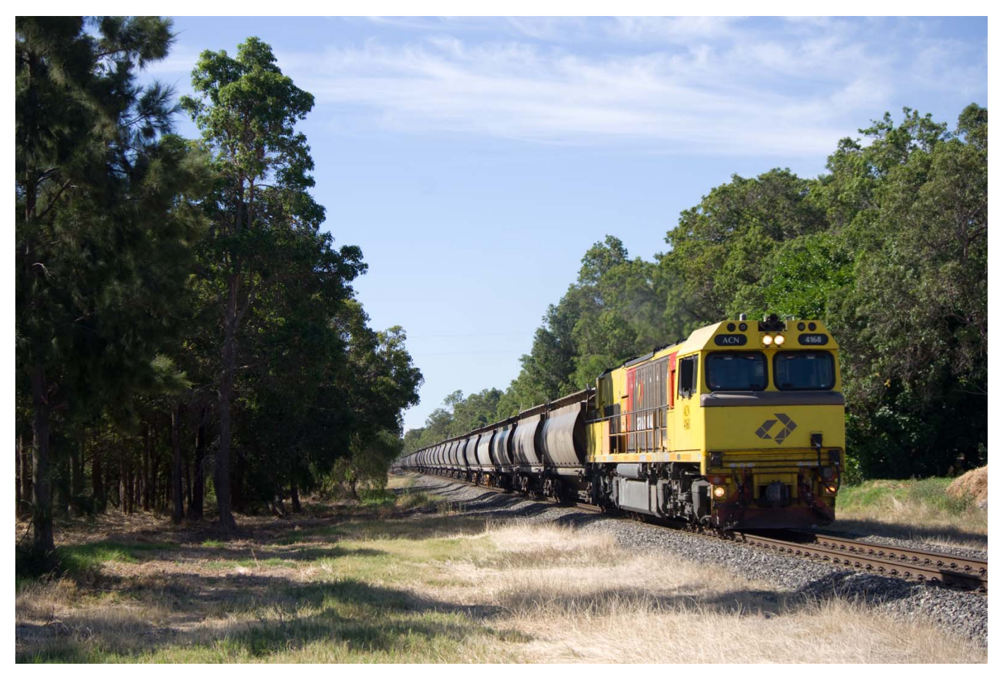
6875 rolls through Warrawarup behind ACN4168 on 22<sup>nd</sup> February.