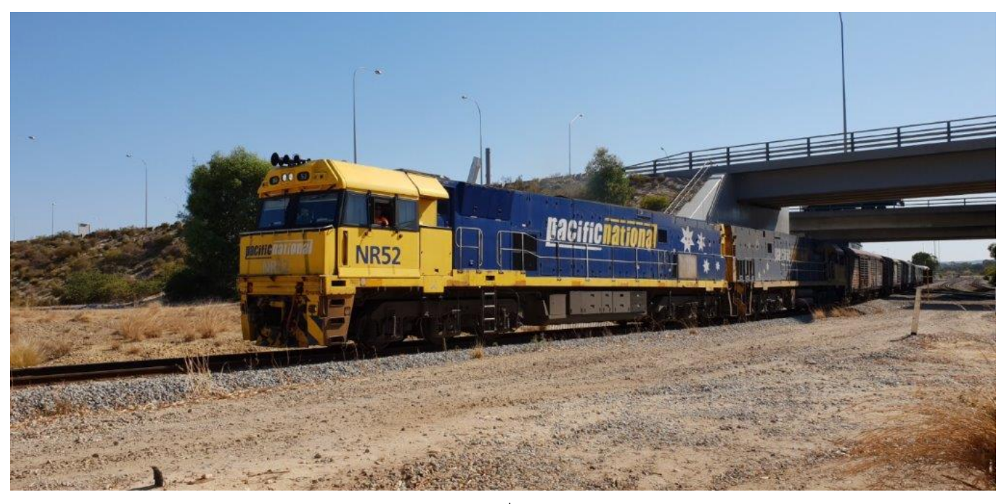
NRs 52 & 98 depart Kewdale with 2P56 Sadleirs shuttle, 25th February.