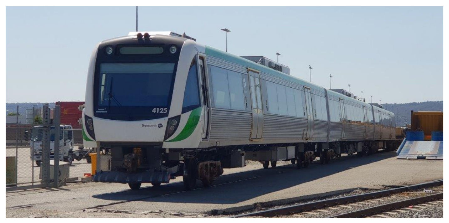
New TransPerth B set #125 at Perth freight terminal, 25<sup>th</sup> February.