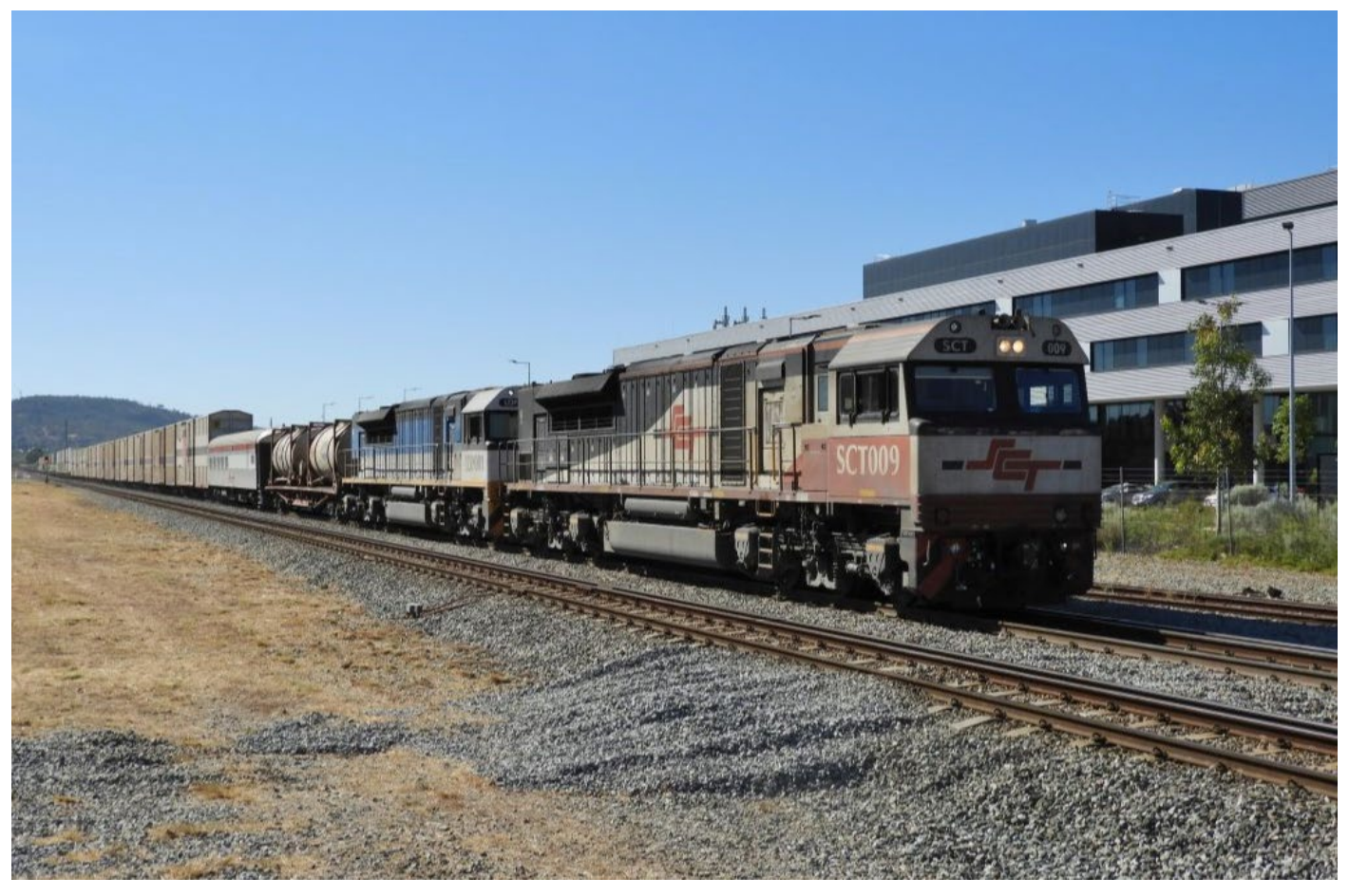
SCT009 & LDP001 on a derailment-delayed 5MP9 through Midland, 24^{\text{th}} February.