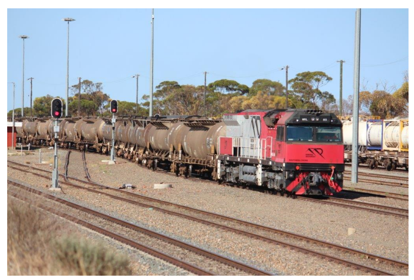
MRL003 hauls empty fuel tanks for Esperance through West Kal yard, 25<sup>th</sup> February.