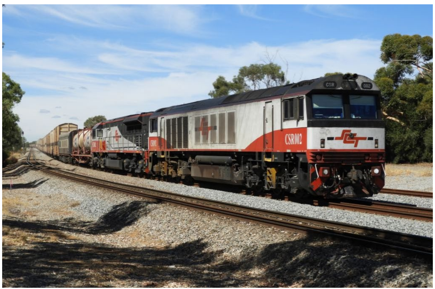
CSR002 leads SCT002 on 7PM9 through Woodbridge, 23<sup>rd</sup> February.