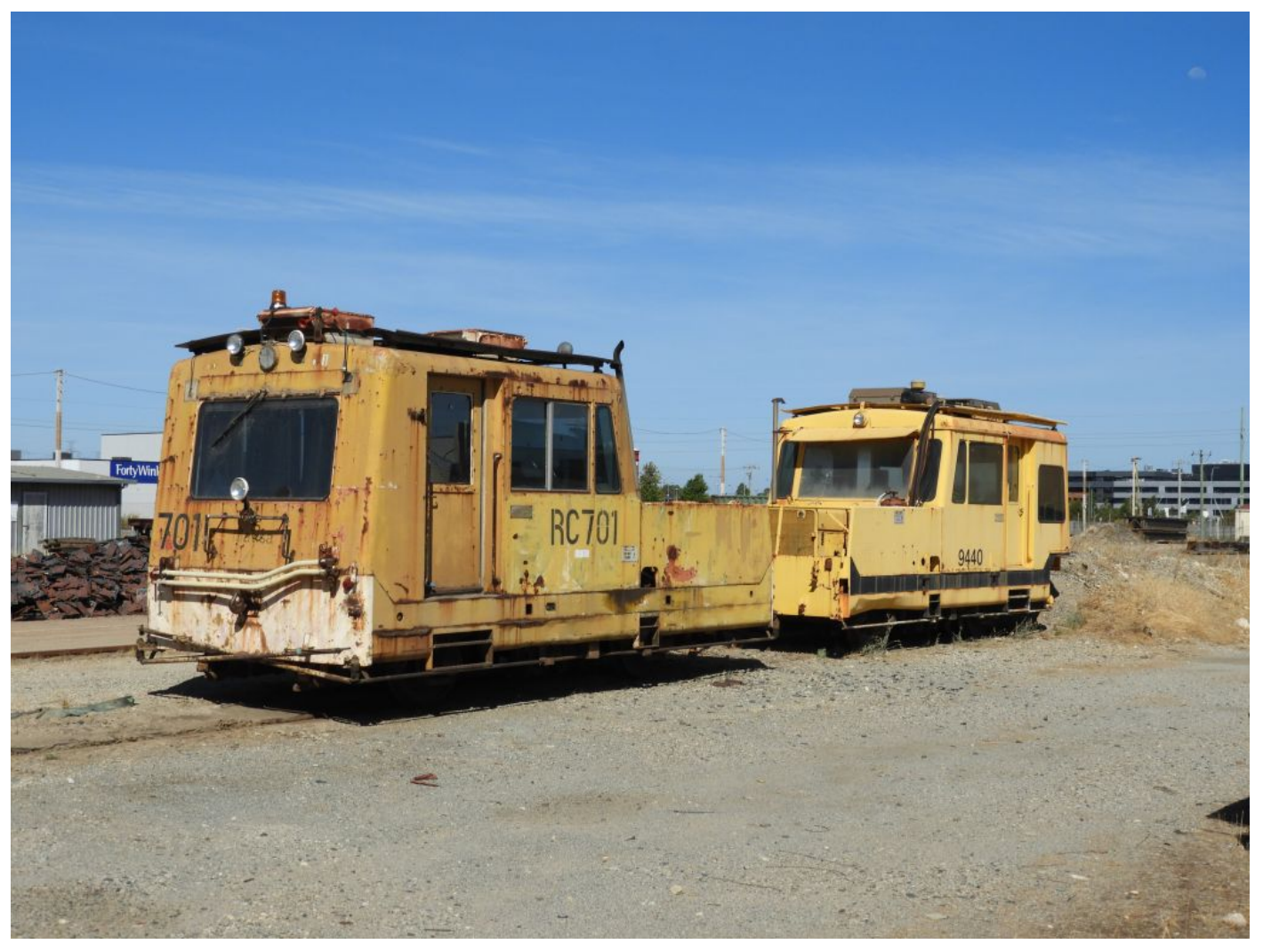
Matissa rail flaw detection vehicles RC701 and 9440 in the Flashbutt yard, Midland, 24/2.