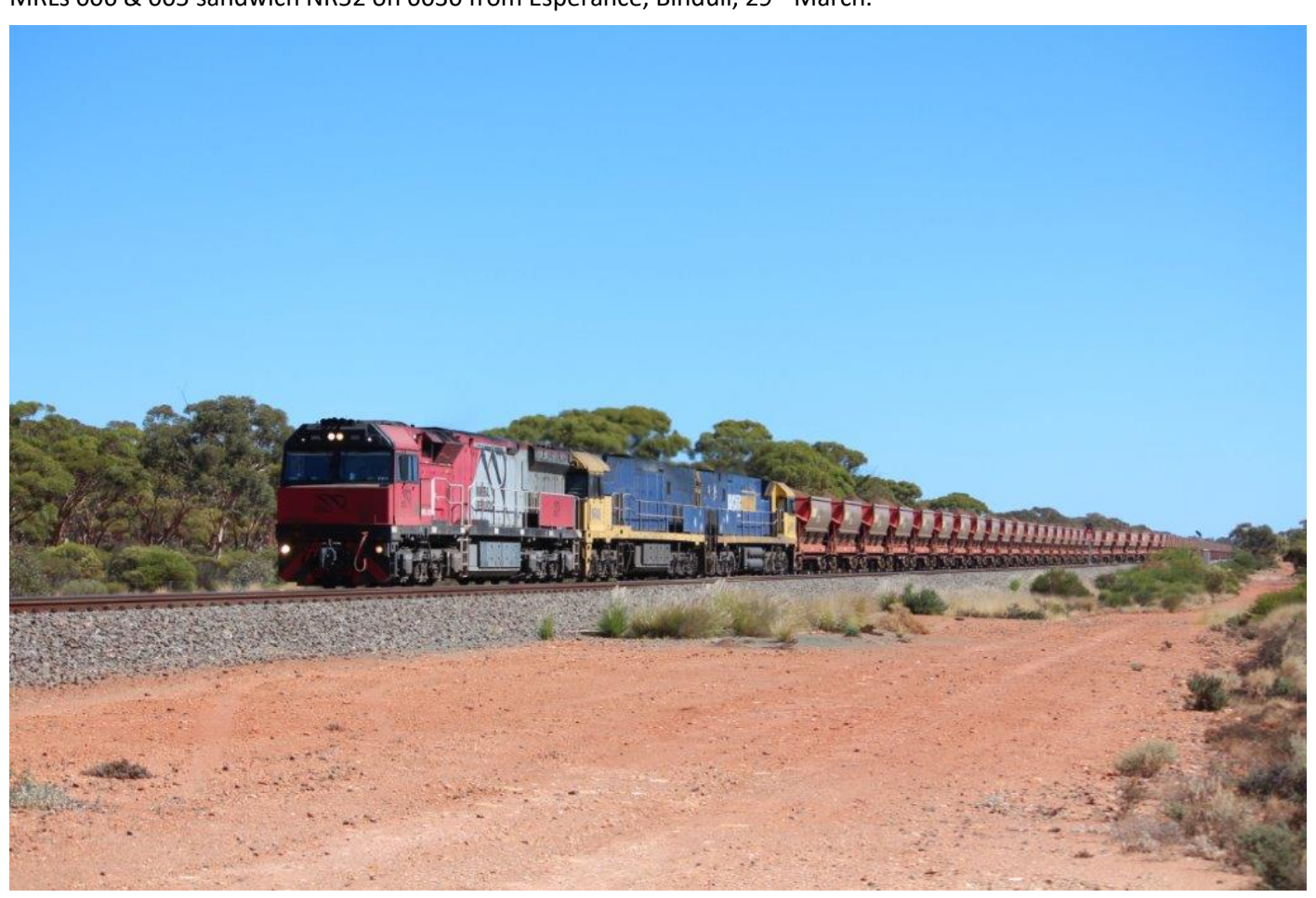
MRL002 leads NRs 48 & 19 into Binduli on 6033 loaded ore, 29<sup>th</sup> March.