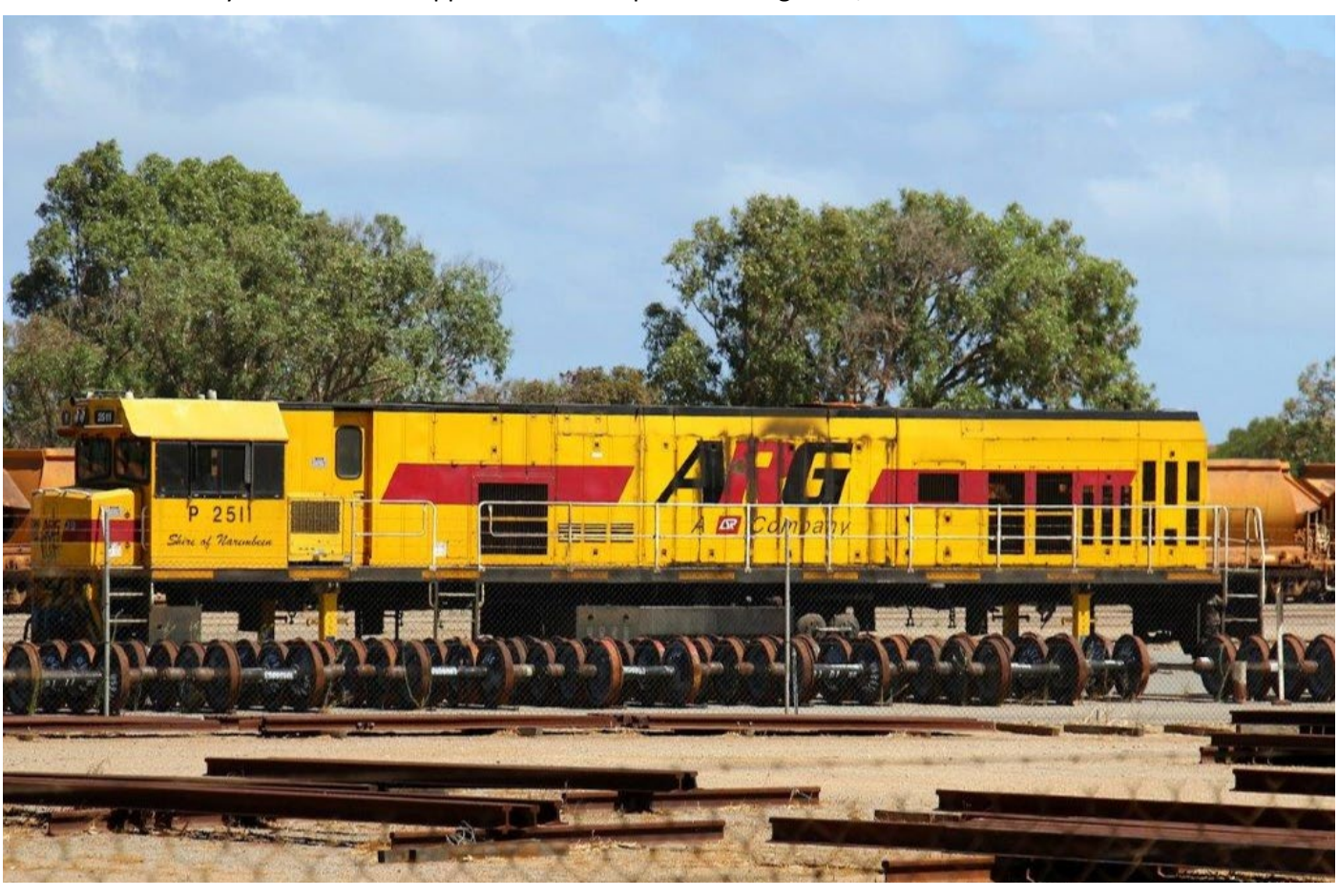
P2511 stored without bogies at Narngulu, 16<sup>th</sup> March.