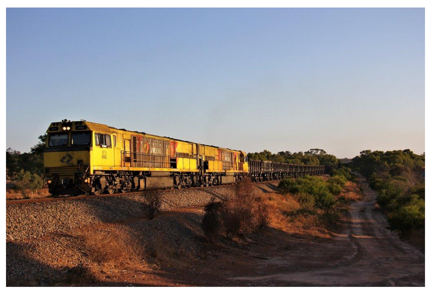
The setting sun catches 7764 empty Karrara ore led by ACNs 4142 & 4174 at Bringo, 23<sup>rd</sup> March.