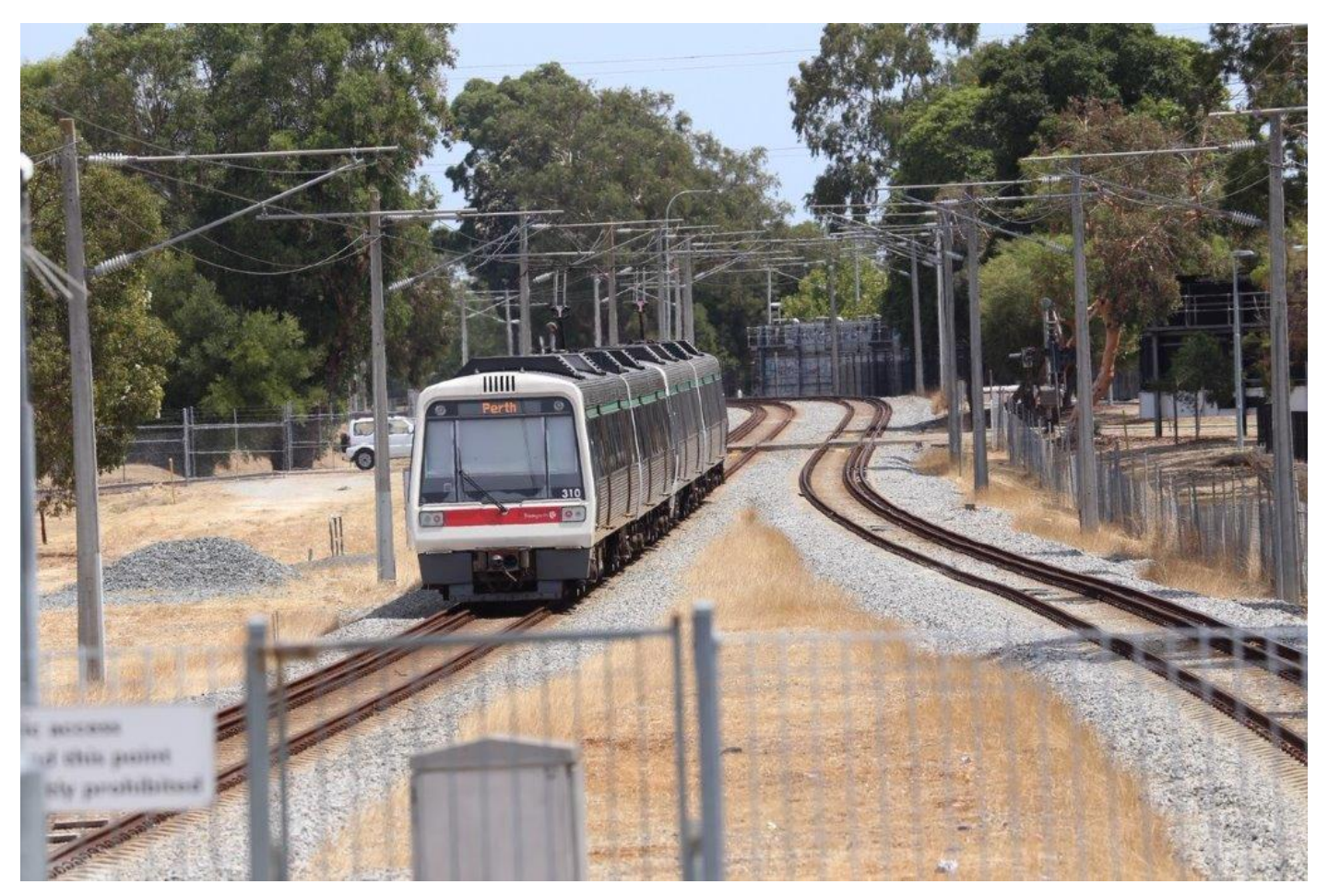
TransPerth A sets 16 & 10 depart Woodbridge for Perth and Fremantle, 4<sup>th</sup> March.