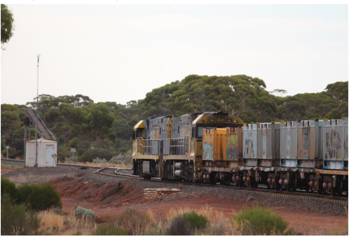
NRs 64 & 116 stabled on 1MP2 at Golden Ridge due to Bullsbrook bushfire, 6<sup>th</sup> March. Page 8 of 31