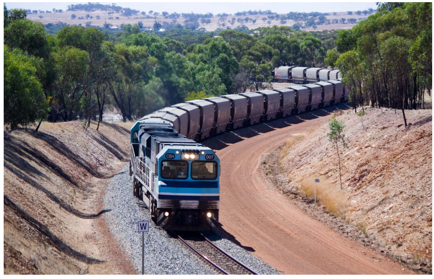
CBHs 007 & 008 snake around the curves and up the grade at Noggojerring with 1K26, 17^{th} March.