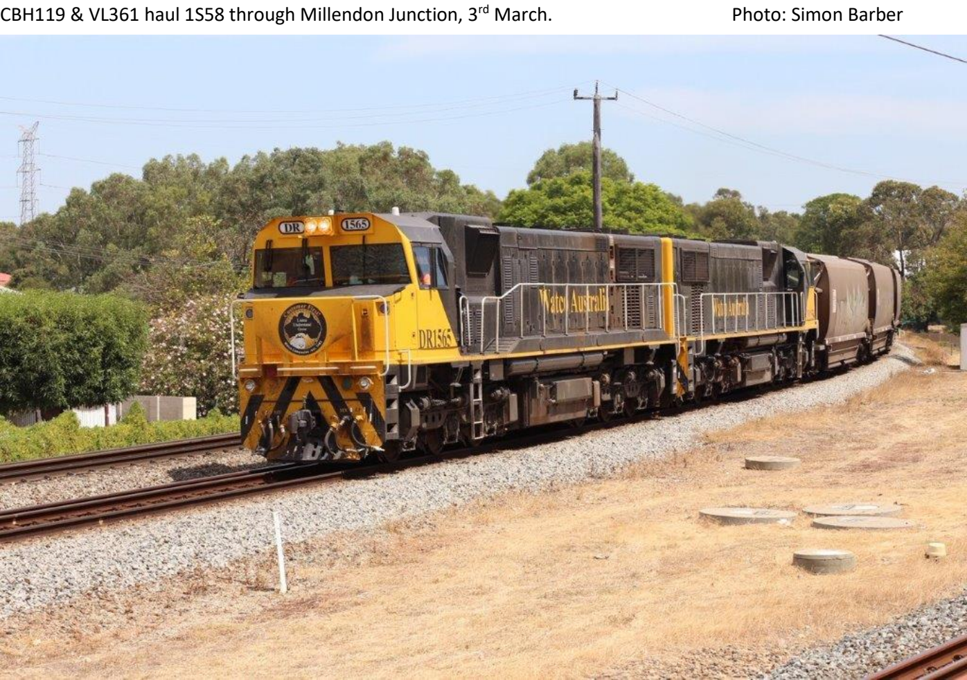
2K67 empty grain to Koorda passes through Woodbridge behind DRs 1565 & 1564, 4/3. Page 3 of 31