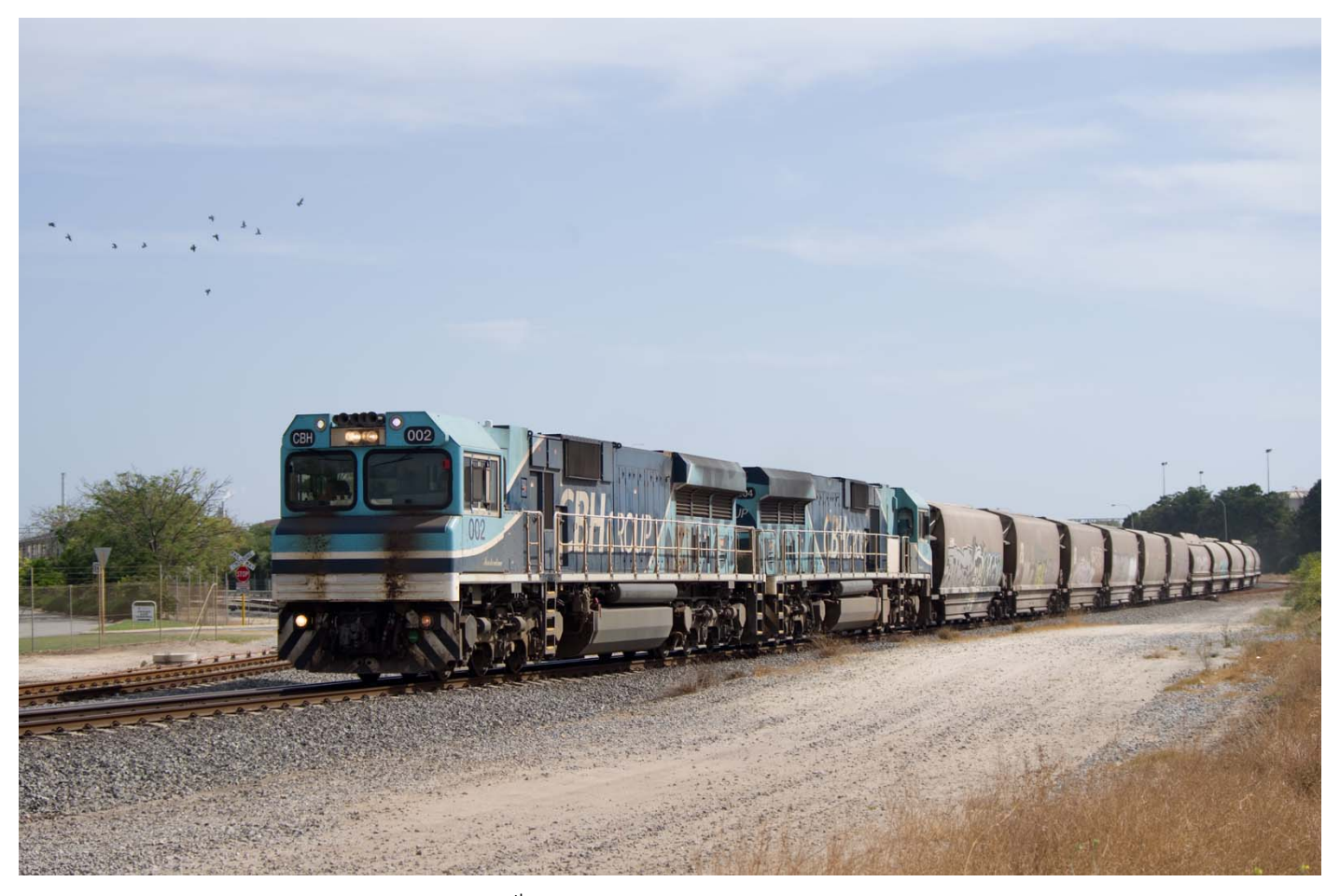
CBHs 002 & 004 lead 2K23 out of Kwinana, \mathbf{4}^{\text{th}} March.