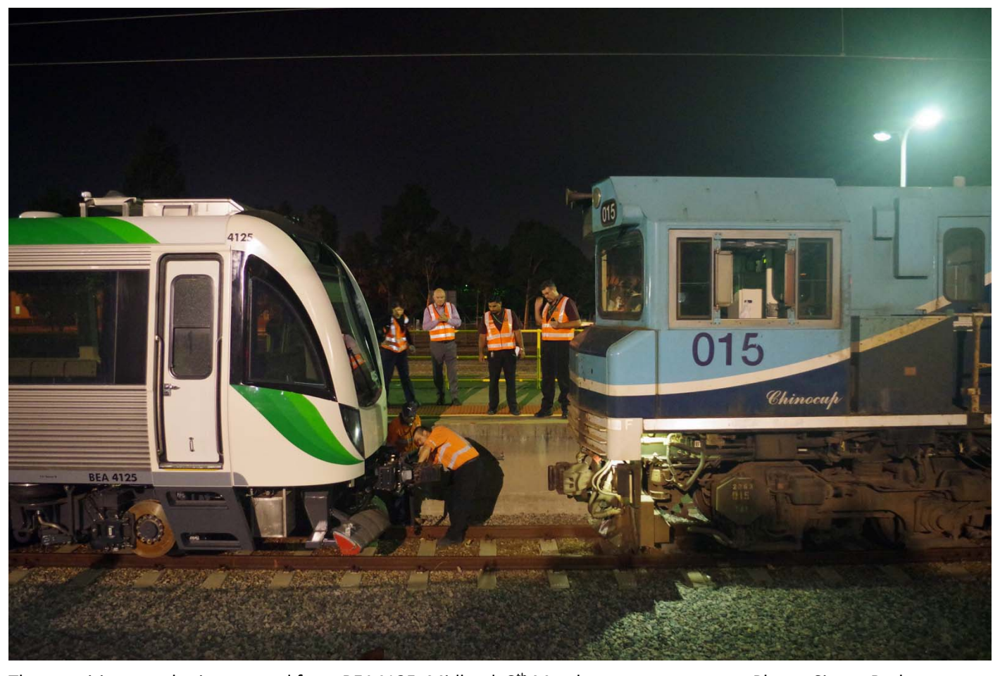
The transition coupler is removed from BEA4125, Midland, 8<sup>th</sup> March.