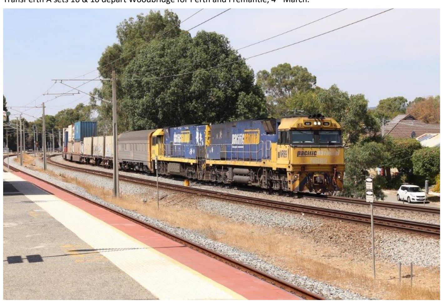
NRs 89 & 36 lead 5-hour-late 6MP5 through Woodbridge, 4^{\rm th} March. Page {\bf 4} of {\bf 31}