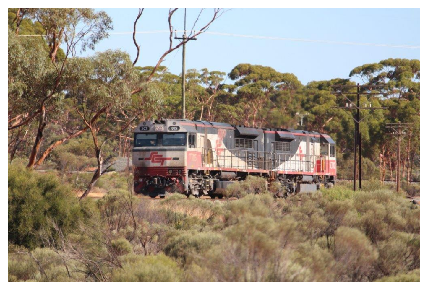
SCTs 015 & 012 in unfamiliar territory, turning on Binduli triangle due to faulty SCT015, 12/3.