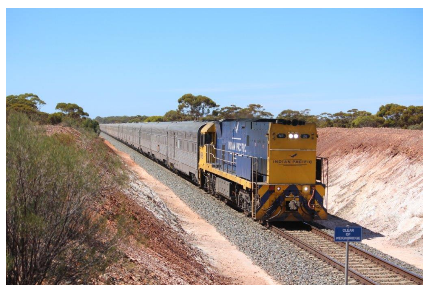
Control screen issues required NR26 turned at Binduli. Now nearly 9 hours late, 5AP8 approaches Bonnie Vale, 30/3.