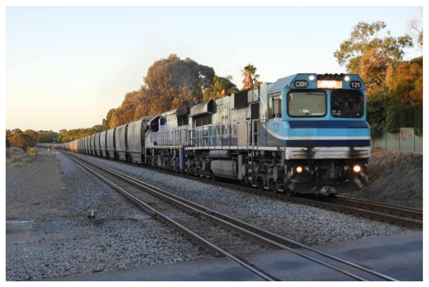
CBH121 combines with VL361 to power 1S56 grain through Hazelmere, 24^{\text{th}} March.