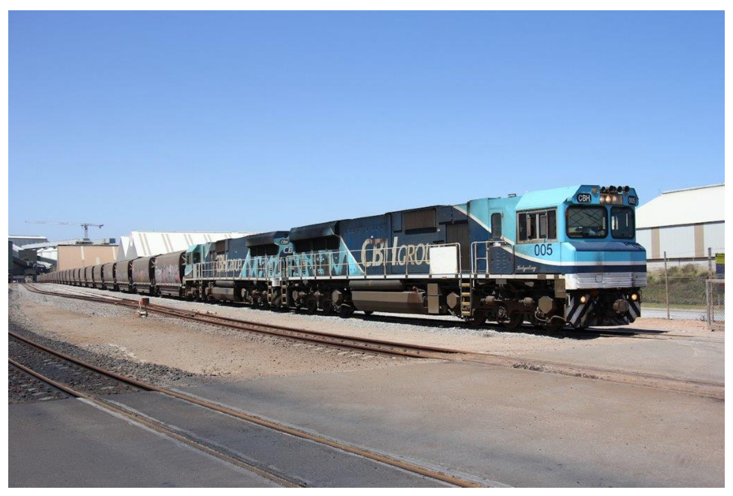
CBHs 005 & 003 stand at Geraldton with 2G52 empty grain, 11<sup>th</sup> March.