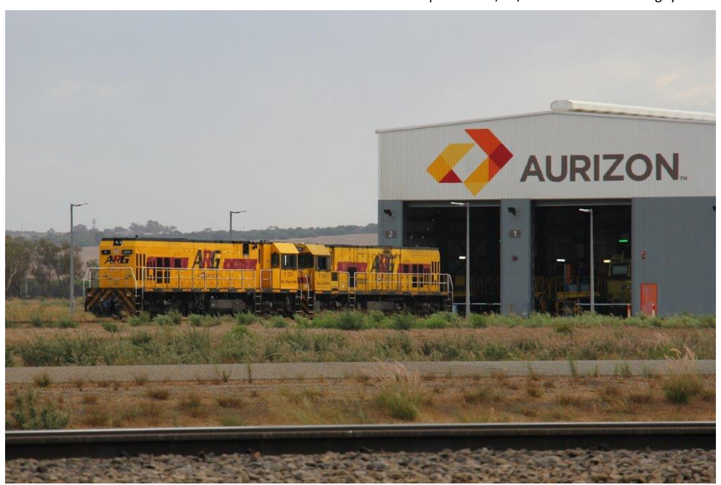
Ps 2514 & 2511 stabled at Narngulu East loco depot, 12 ^{\rm th} March.