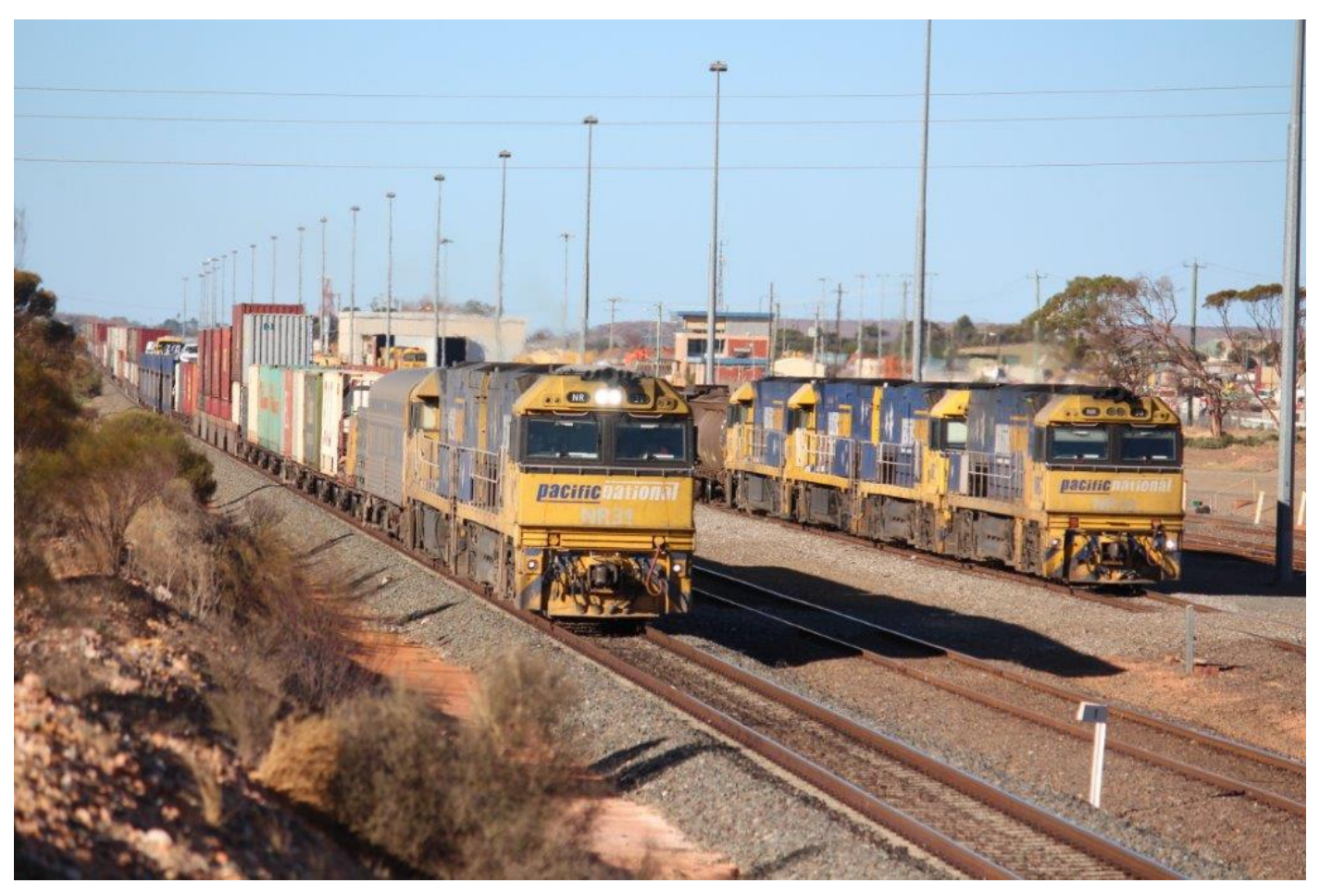
NRs 31 & 46 depart on 4MP5 as NRs 30, 21, 104 & 57 wait on 6445 to Esperance, West Kalgoorlie, 29^{th} March.