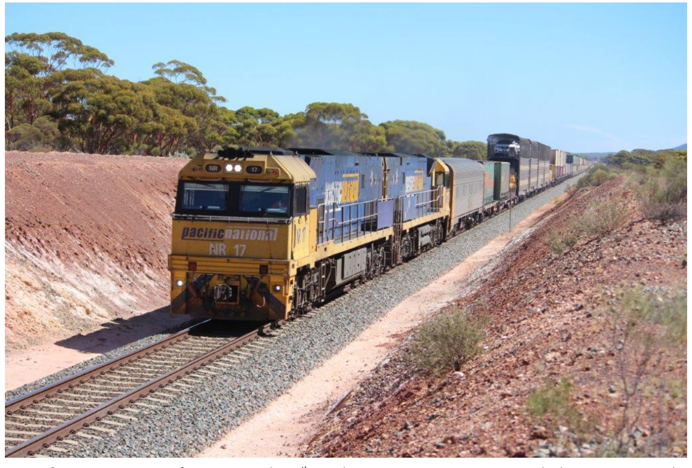
NRs 17 & 99 race 6PM6 away from Bonnie Vale, 30^{th} March.