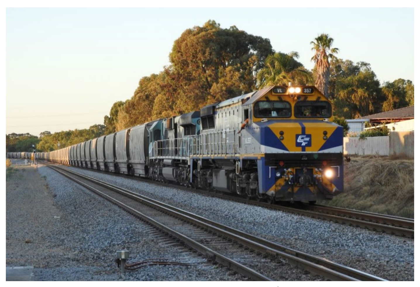
VL357 and CBH122 run S58 Watco grain through Woodbridge near sunset, 17<sup>th</sup> March.