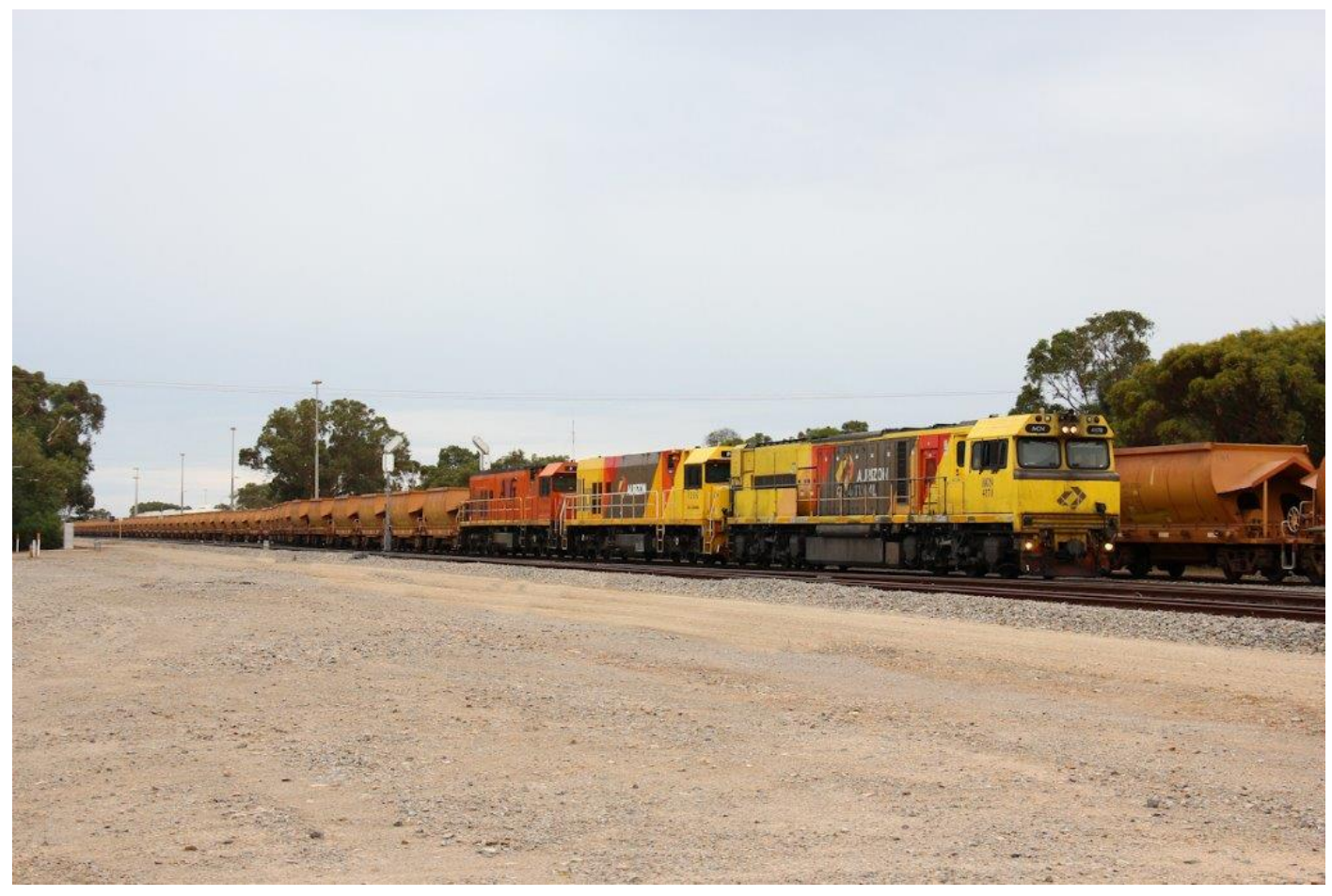
ACN4170 hauls Ps 2506 & 2509 plus 23 AHCF pairs to Forrestfield for storage, Narngulu, 5/3.