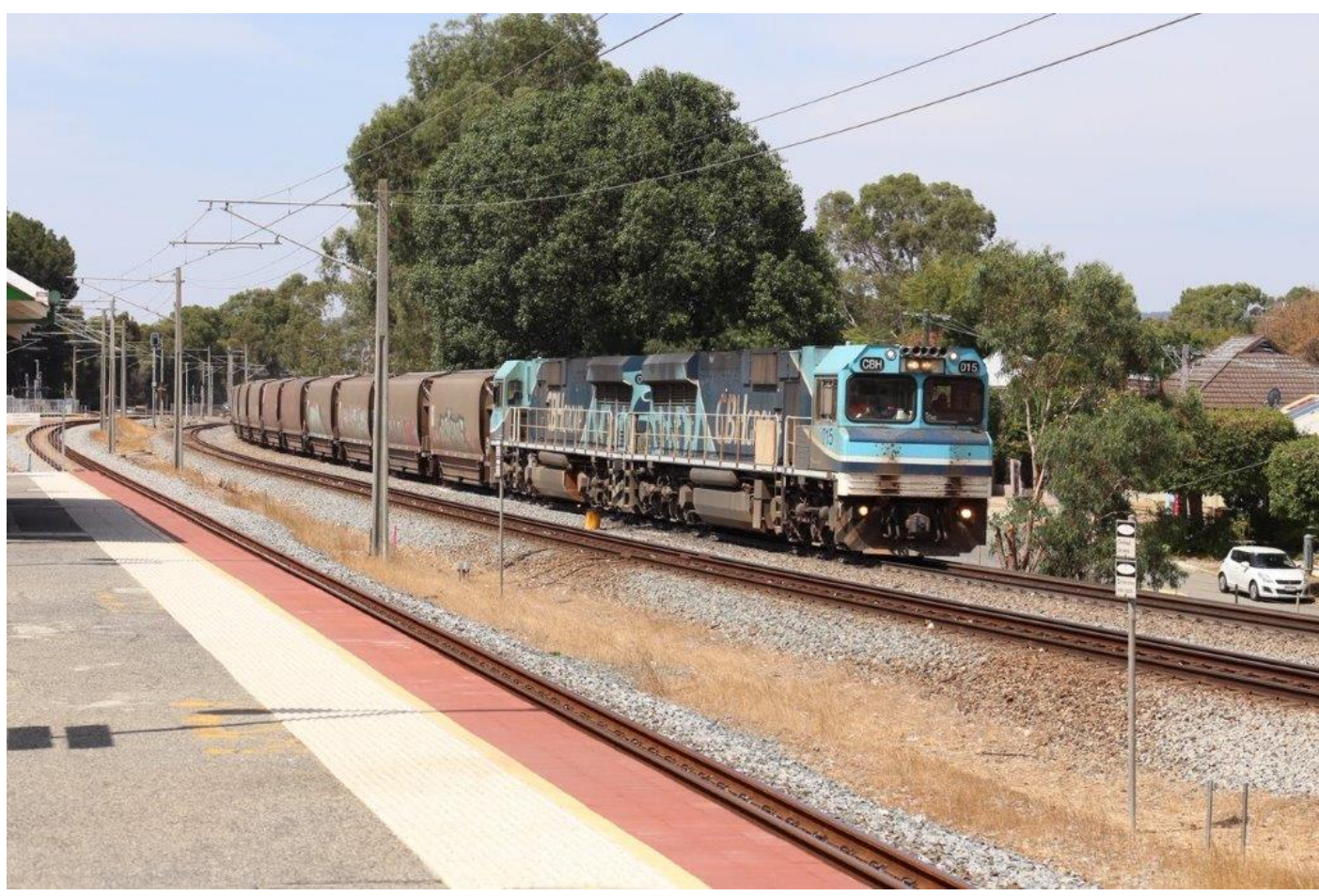
2K68 grain ex Mukinbudin passes through Woodbridge behind CBHs 015 & 013, 4^{\rm th} March. Page 5 of 31