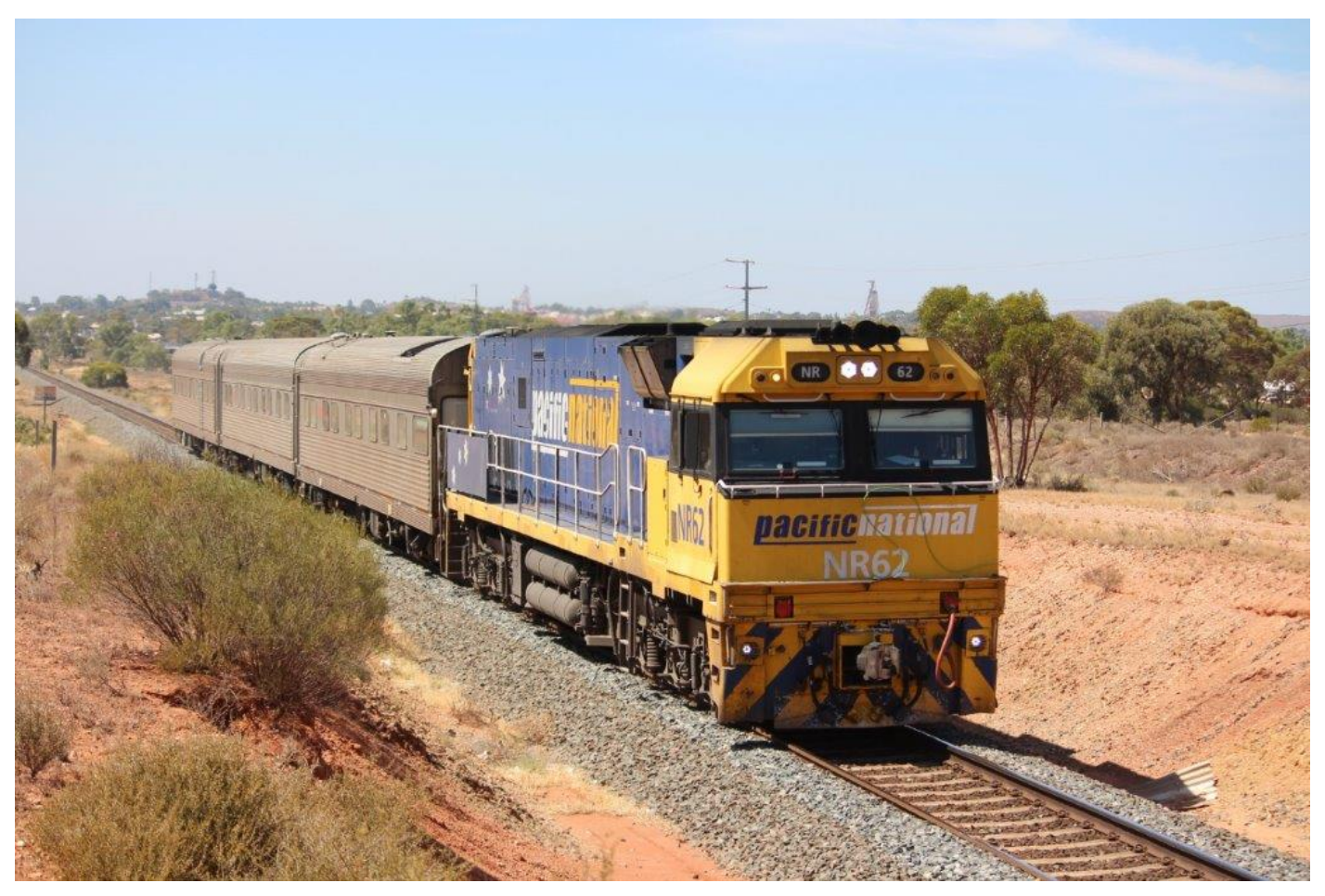
NR62 brings the AK cars back from Leonora, approaching West Kal, 3<sup>rd</sup> March.