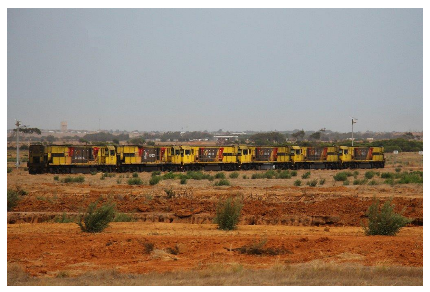
ACNs 4152, 4169, 4148, 4145, 4146 & 4151 run 5Q12 light from Narngulu to Narngulu East, 7/3.