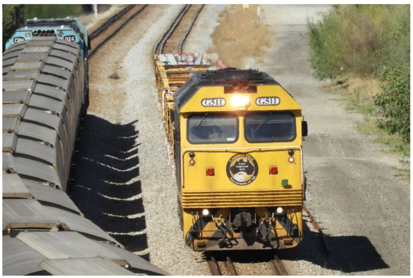
G511 on 2RT3 Forrestfield-Flashbutt empty railset crosses CBHs 002 & 024 on 2K06, South Guildford, 25<sup>th</sup> March.