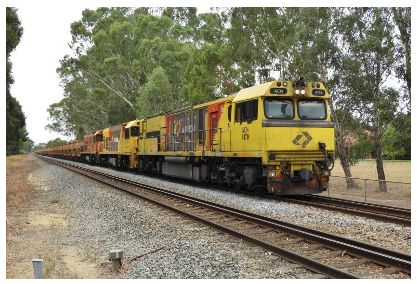
3574 Narngulu to Forrestfield for storage of two Ps and hoppers, Middle Swan, 6<sup>th</sup> March.