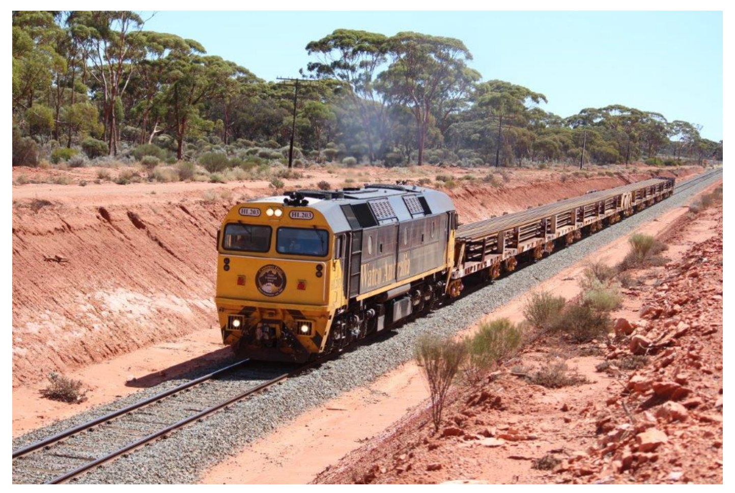
7RT1 resumes its journey onto the Esperance line behind HL203, 31^{\text{st}} March.