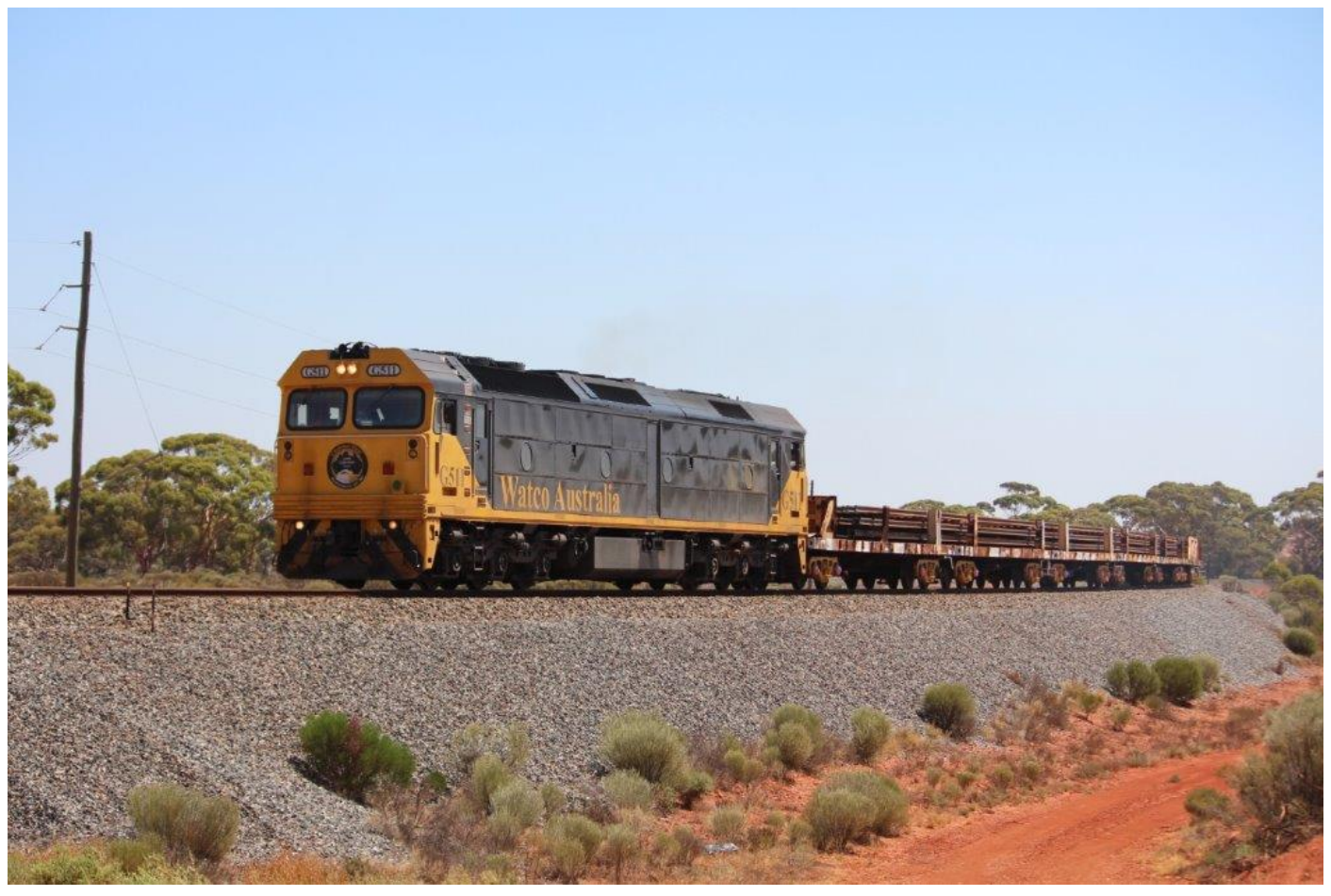
Watco's G511 hauls a set of rail flats as 1RT1 around the triangle at Binduli, bound for the Esperance line, 3<sup>rd</sup> March.

NUMBER 3 A free monthly photo e-Mag of railway happenings in WA during March 2019 PUBLISHER Peter Donaghy Email: <a href="mailto:peterdonaghy2@bigpond.com">peterdonaghy2@bigpond.com</a> Copyright: Peter Donaghy © 2019