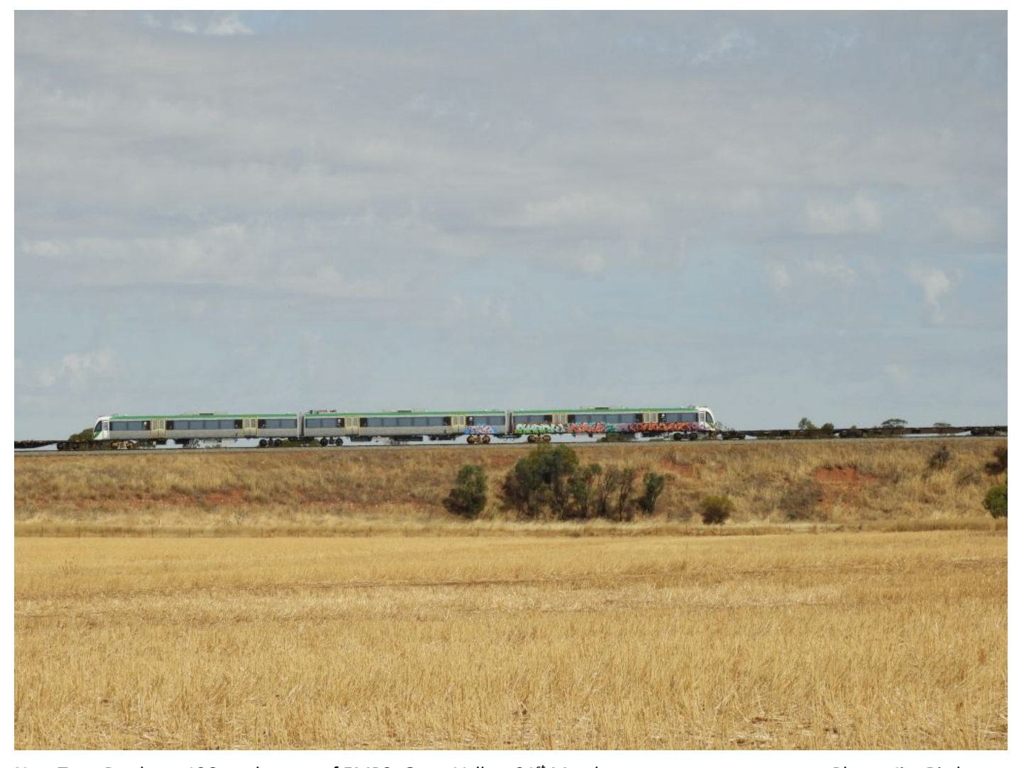
New TransPerth set 126 on the rear of 5MP2, Grass Valley, 31^{\text{st}} March.