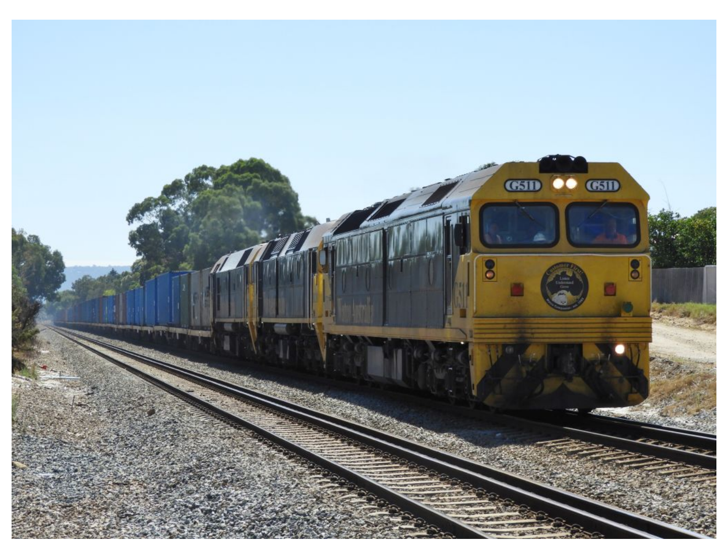
G511, HL203 & FL220 run 2142 shuttle to North Port, Thornlie, 11<sup>th</sup> March.