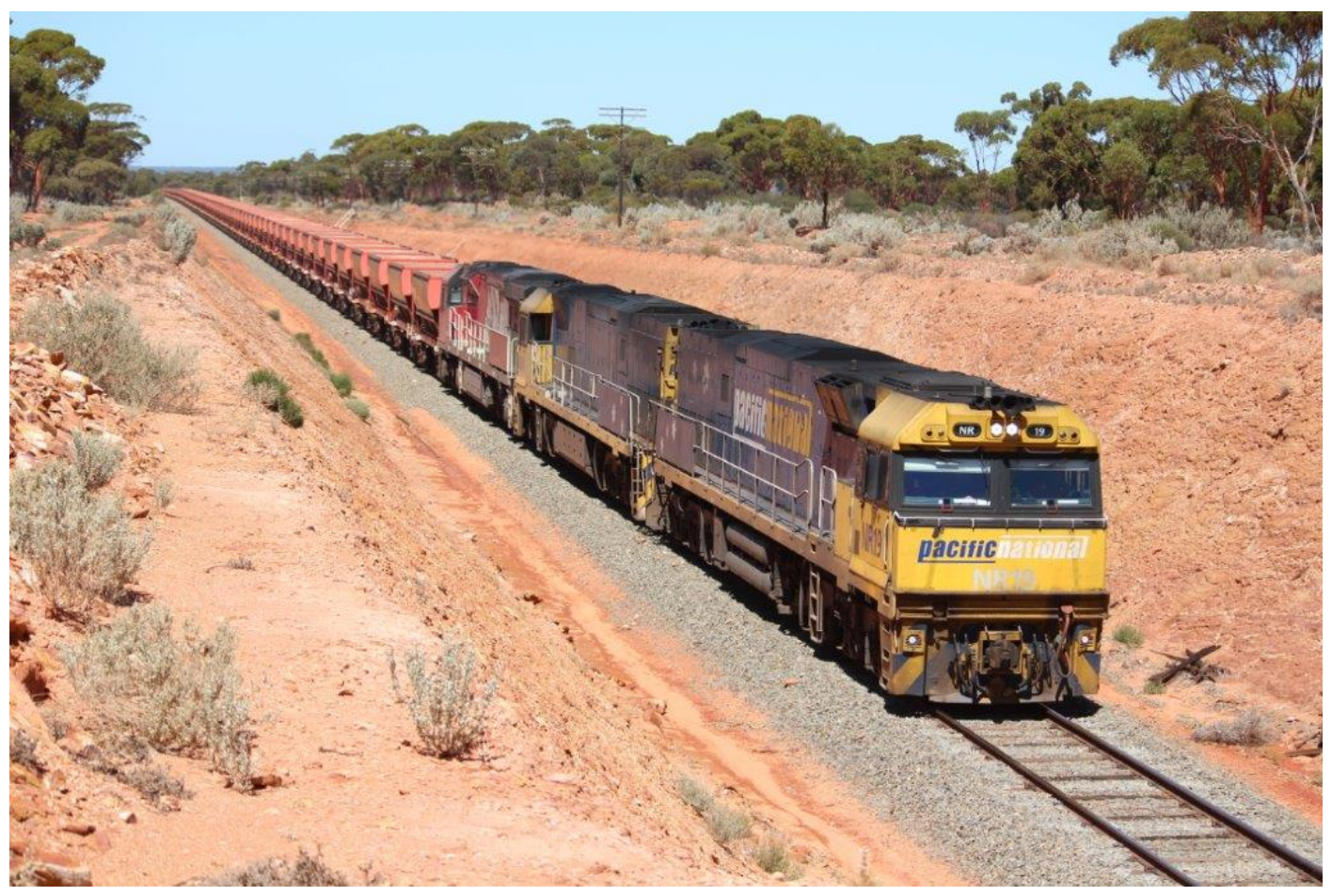
NRs19 & 48 lead MRL002 on 1030 ex Esperance, approaching Binduli, 24^{th} March. Page 21 of 31