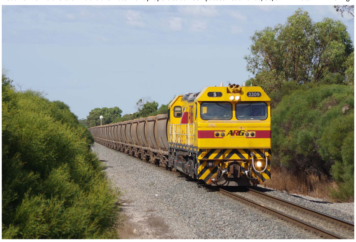
S3309 runs 1968 through Kwinana, 31^{\text{st}} March.