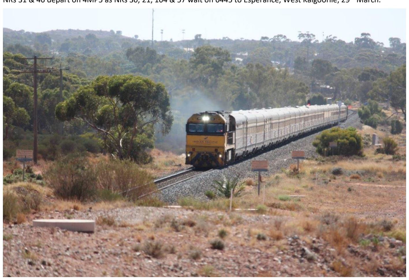
Running over six hours late, 5AP8 Indian Pacific approaches West Kalgoorlie, 30/3.