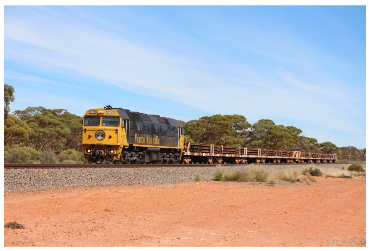
HL203 arrives at Binduli with 7RT1 loaded railset, 31st March.