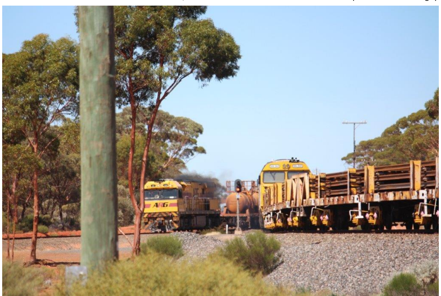
AC4304 takes the east leg at Binduli with 1406 loaded acid ex Hampton as HL203 waits on the west leg, 31^{st} March. Page 29 of 31