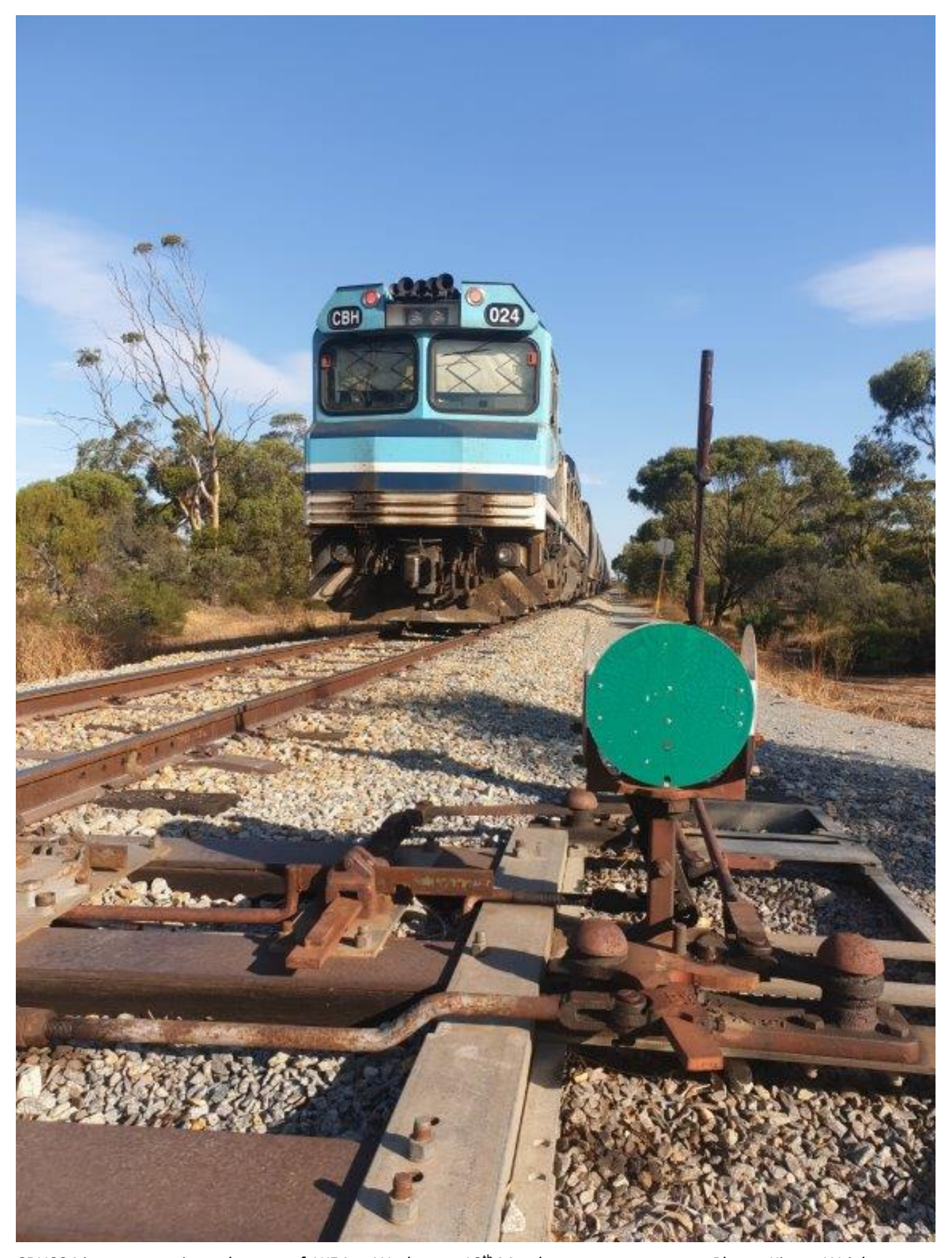
CBH024 is remote unit on the rear of 1K54 at Watheroo, 10^{\text{th}} March.