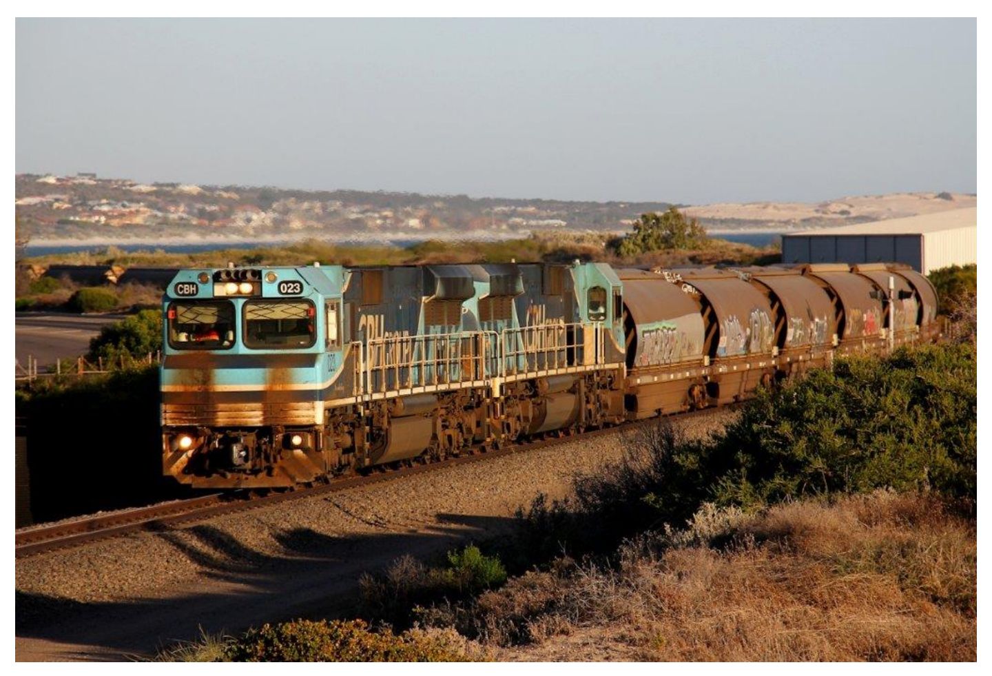
Heat from CBHs 023 & 011 blurs the waterfront properties as 7G31 passes Beachlands, 30/3.