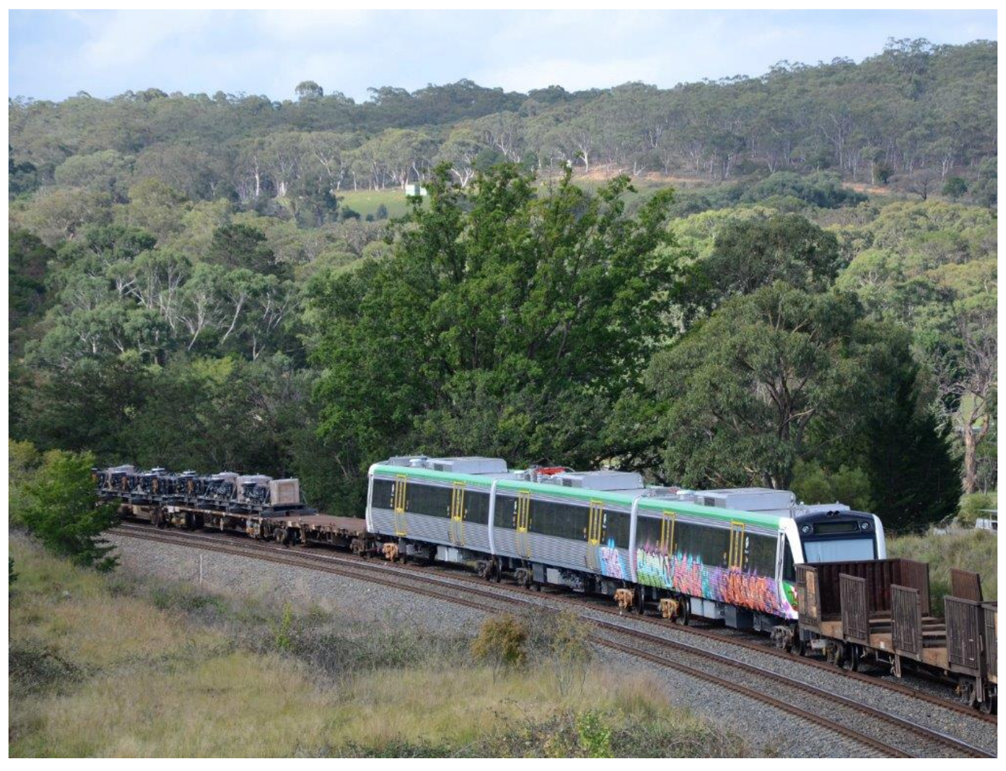
Heavily graffitied new TransPerth B set #126 and its narrow gauge bogies pass through North Goulburn, NSW, on the rear of 4NY3, 27<sup>th</sup> March.