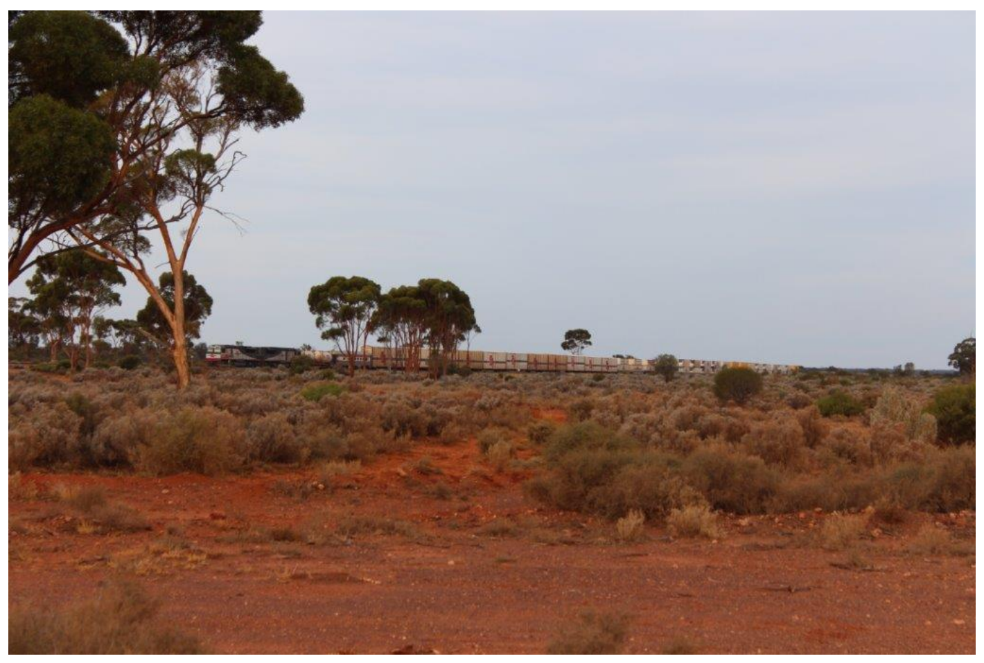
1MP9 (SCT014/004) stabled at Curtin, 5<sup>th</sup> March – track closed by a bushfire in Avon Valley.