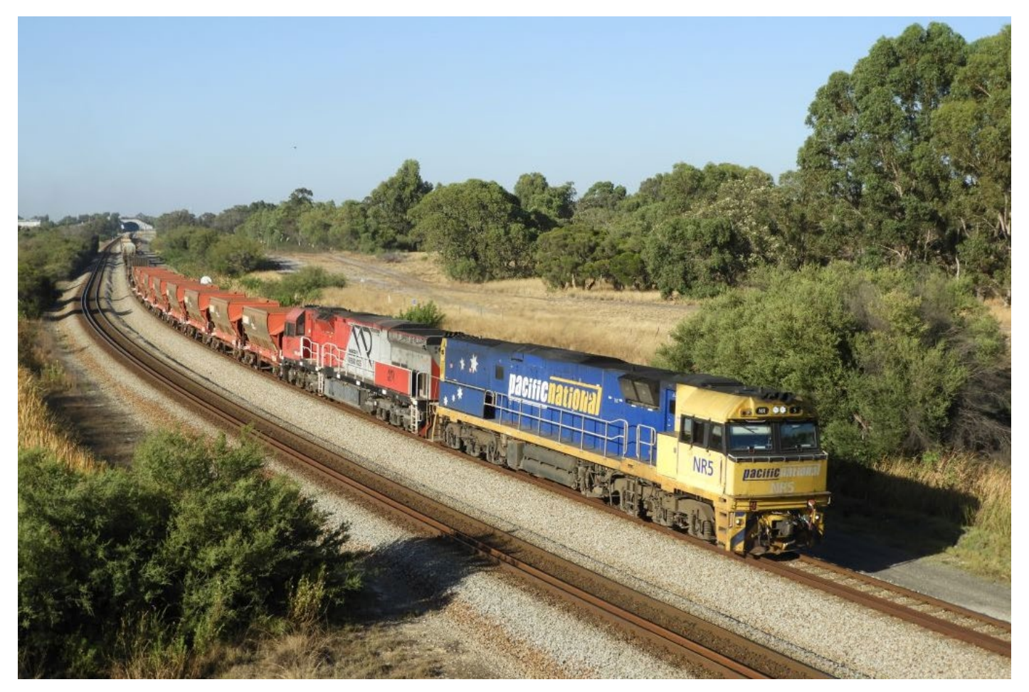
NR5 on 7PX4 conveys MRL002 and hoppers ex workshop back to Kalgoorlie, 16^{\text{th}} March.