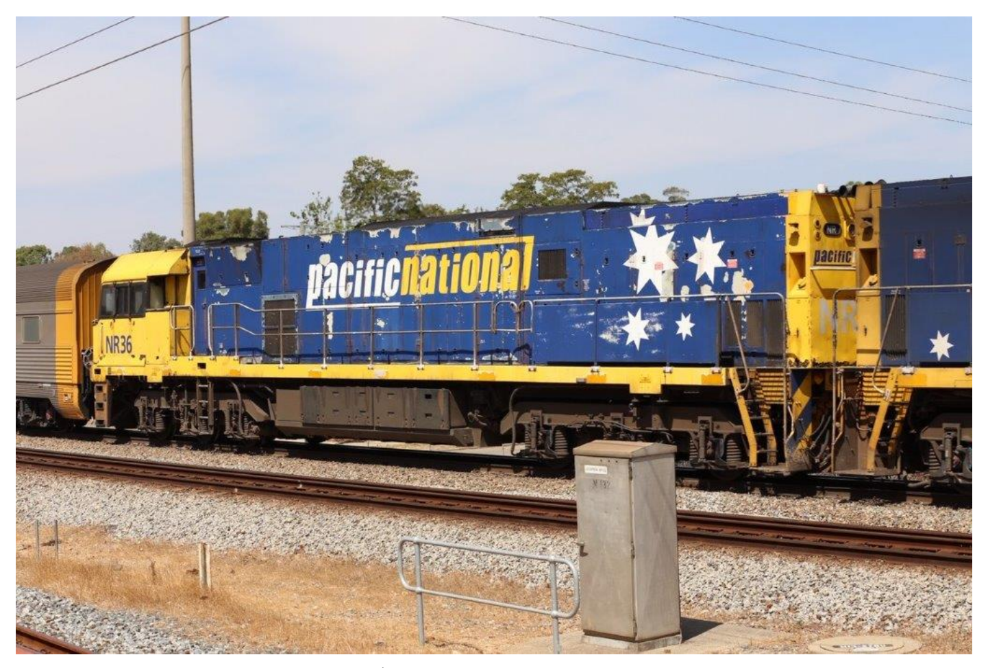
NR36 looking tatty on 6MP5, Woodbridge, 4<sup>th</sup> March.