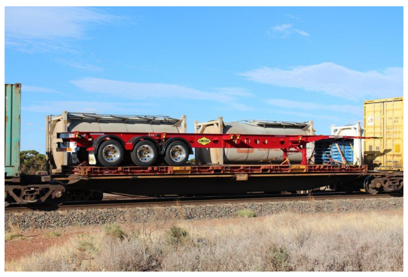
Several dozen new Linfox trailers have been sent west in March and April. 7MP5, 11/3.