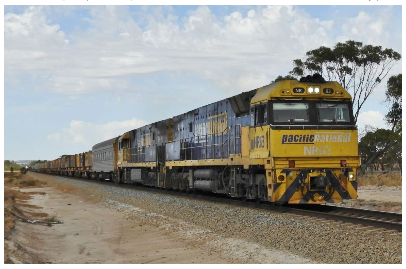
NRs 63 & 96 approach Meenaar with 5MP2, 31st March.