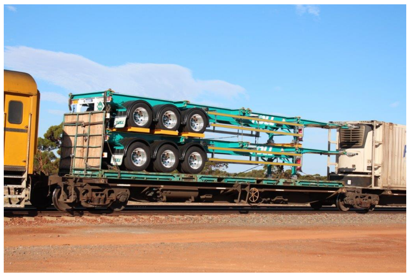
Two new Toll trailers being delivered to Perth on 7MP5, \mathbf{11}^{\text{th}} March.