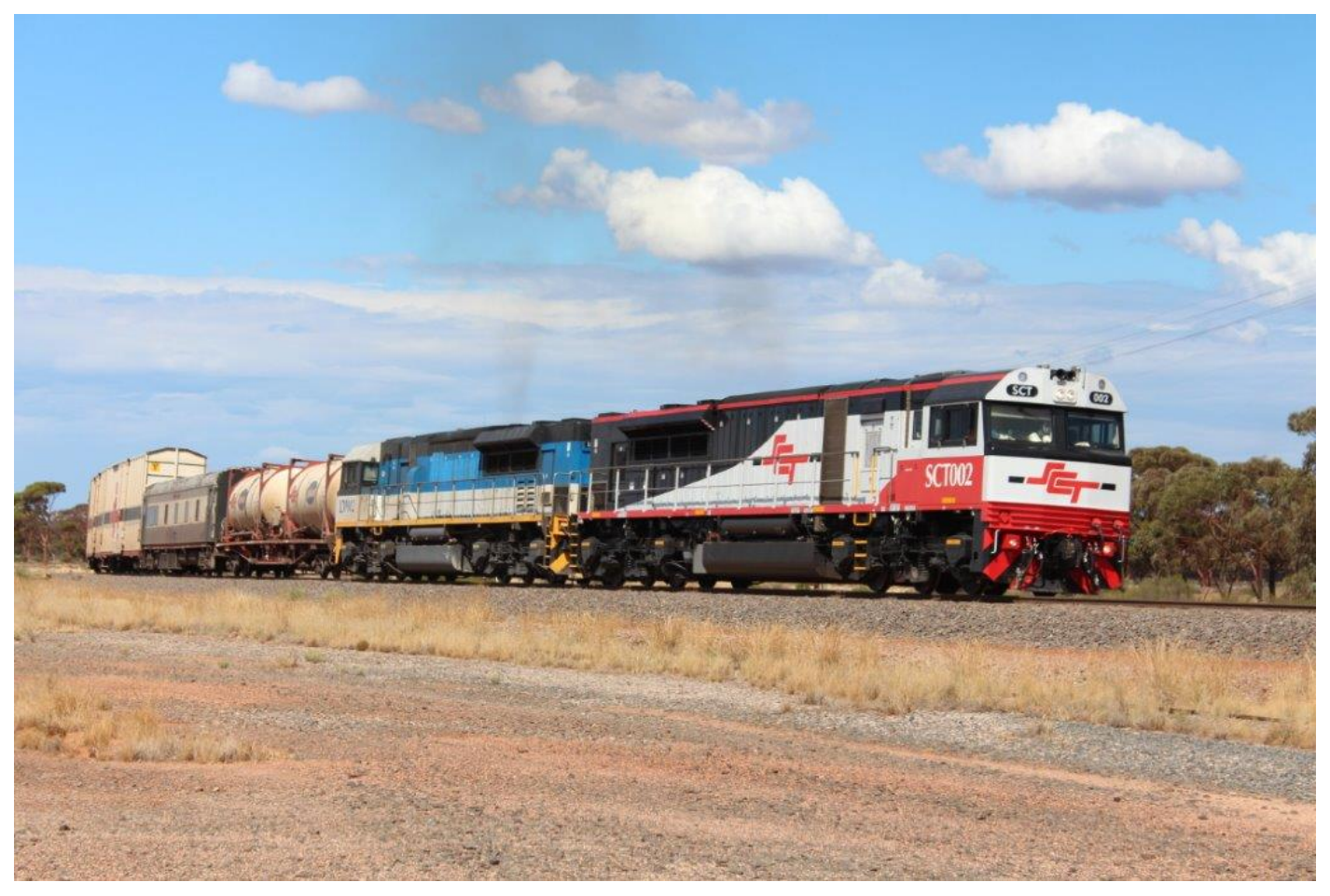
SCT002 & LDP002 depart Parkeston with 5MP9, 16<sup>th</sup> March.