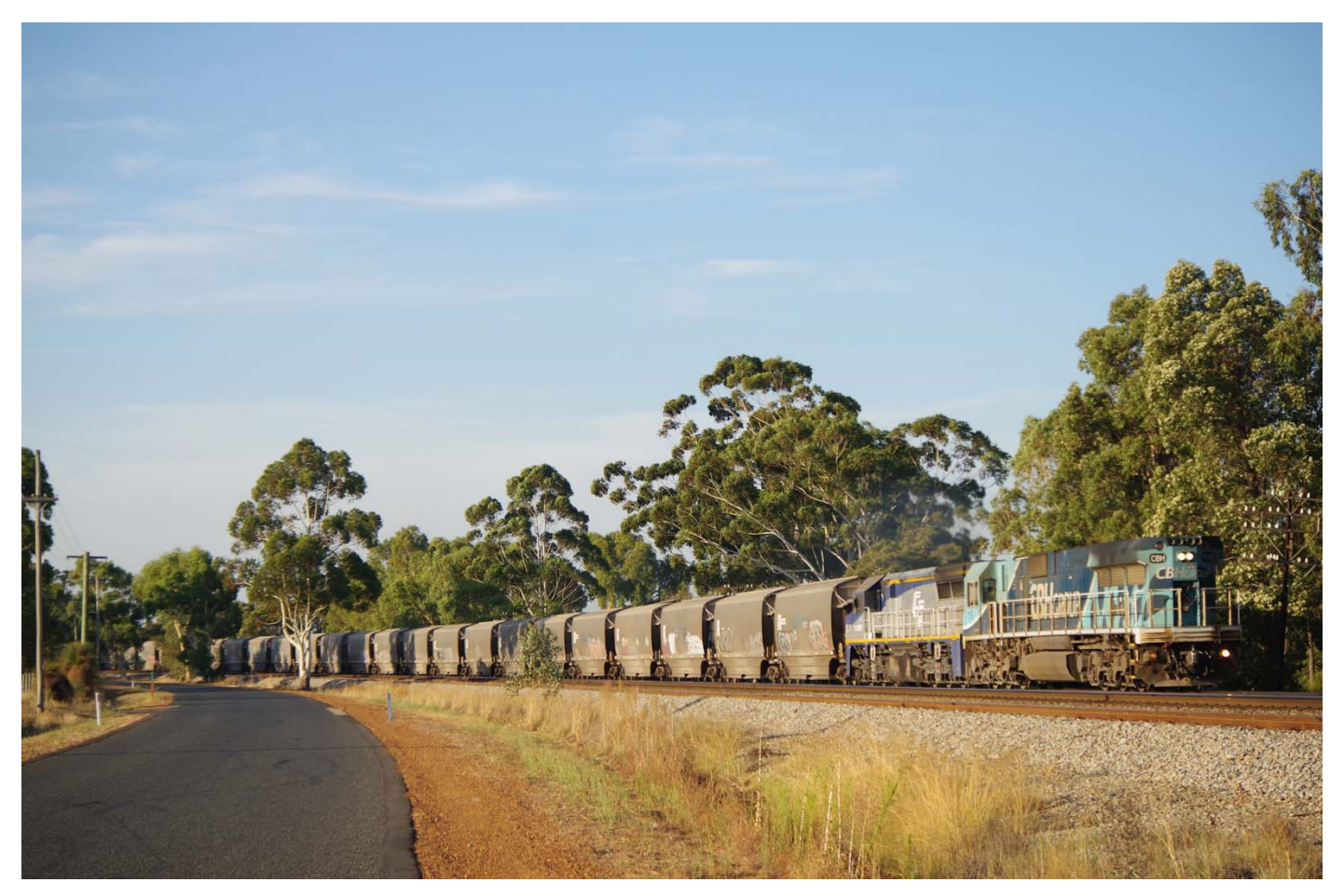
CBH119 & VL361 haul 1S58 through Millendon Junction, 3^{rd} March.