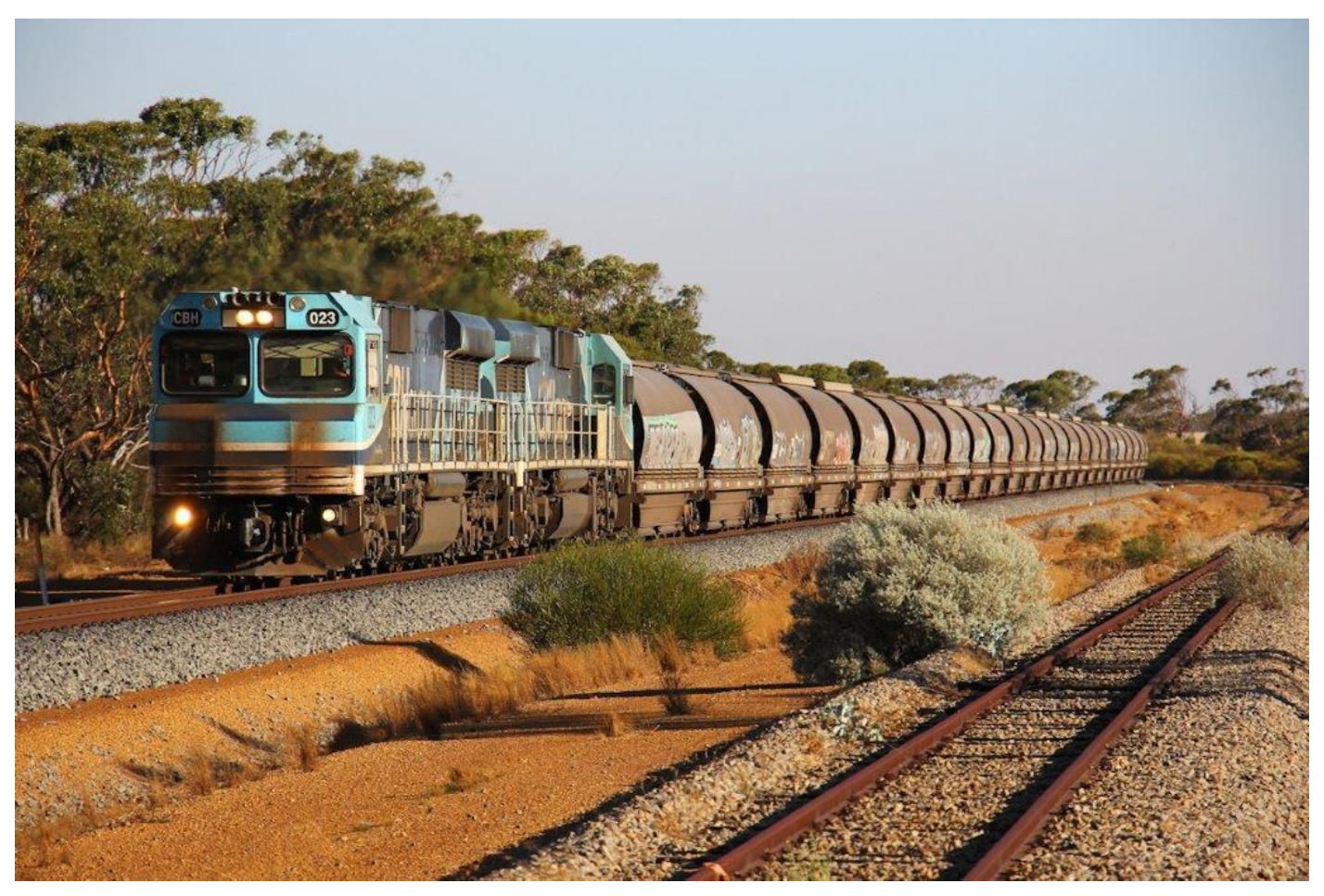
CBHs 023 & 011 with 3G31 loaded grain north of Wilroy, 20^{\text{th}} March.