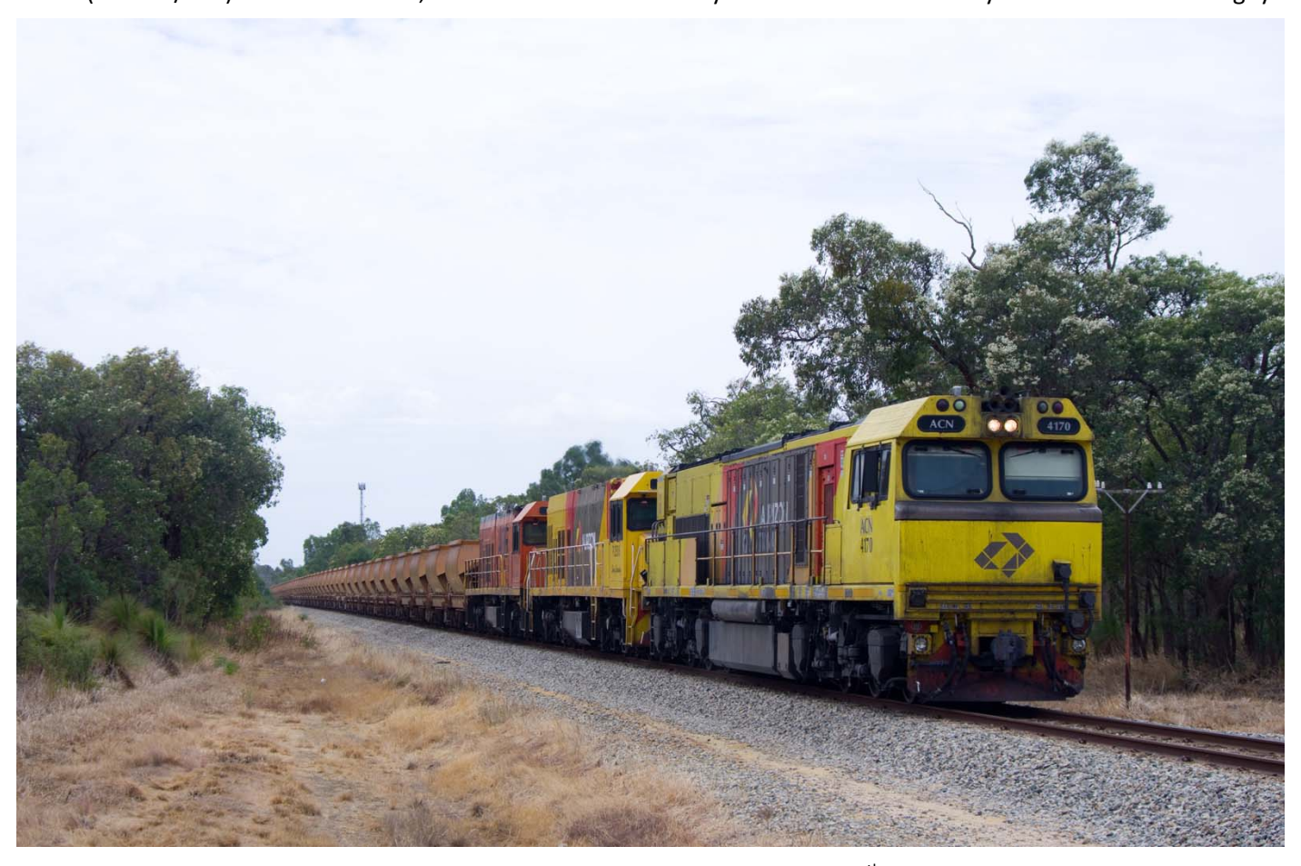
ACN4170 leads Ps 2506 & 2509 on 3574 to Forrestfield storage, Upper Swan, 6<sup>th</sup> March.