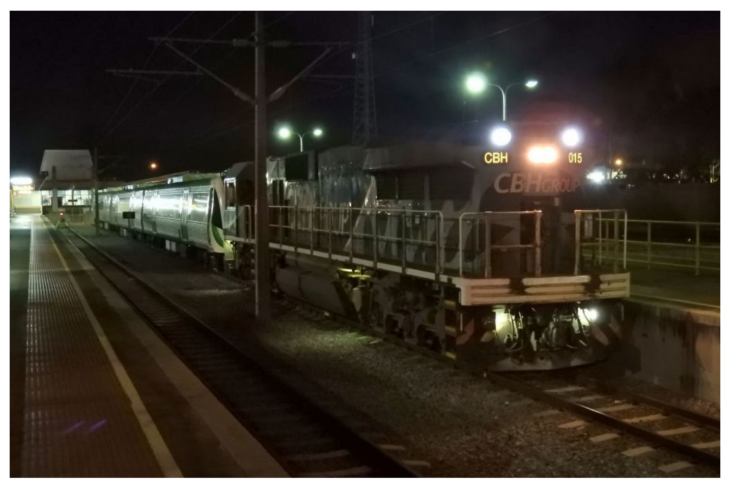
CBH015 delivers regauged set 125 to Midland station as 6WL2, 8^{\text{th}} March.