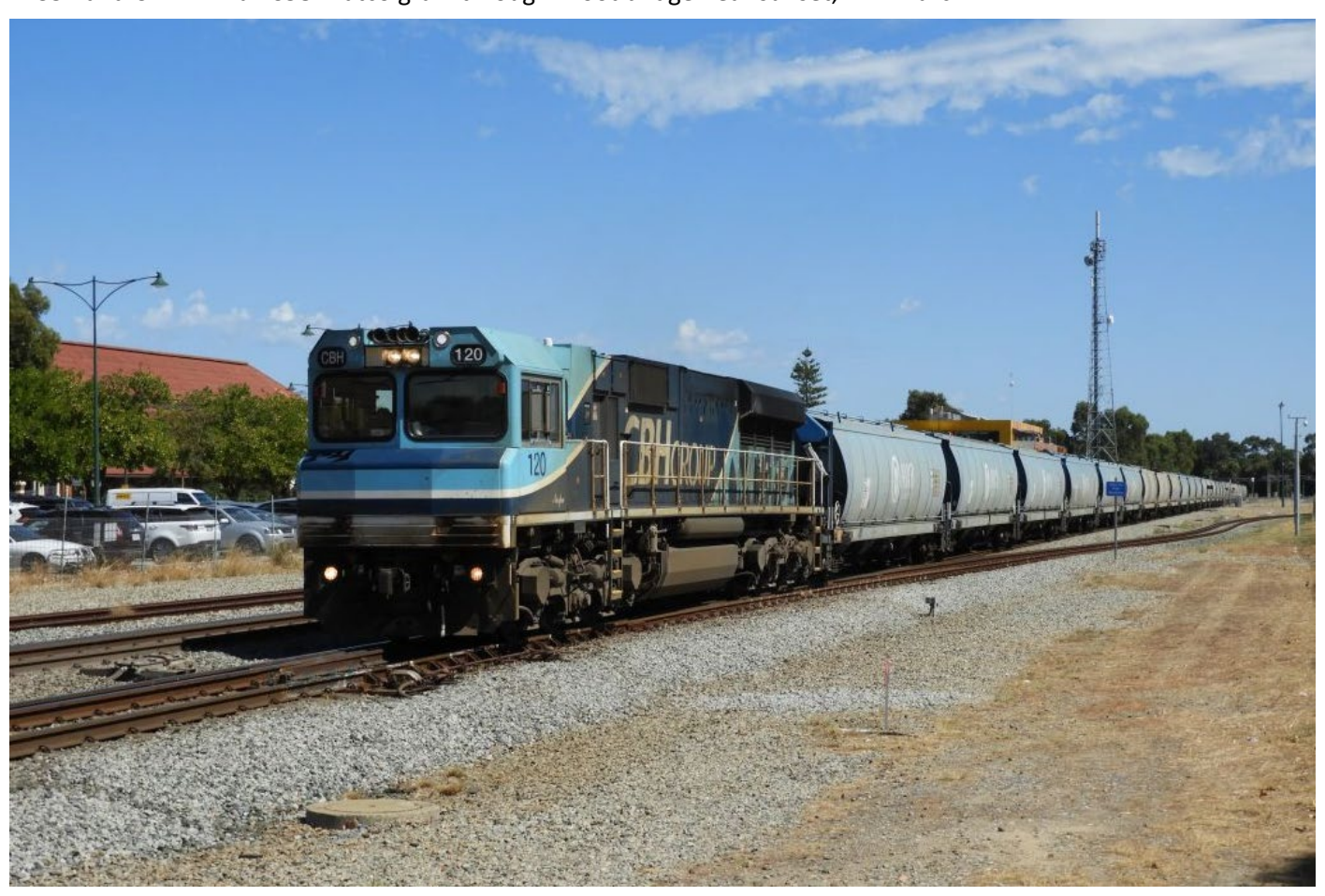
3S57 empty grain (NHXH rake) passes through Midland behind CBH120, 19<sup>th</sup> March. Page 19 of 31