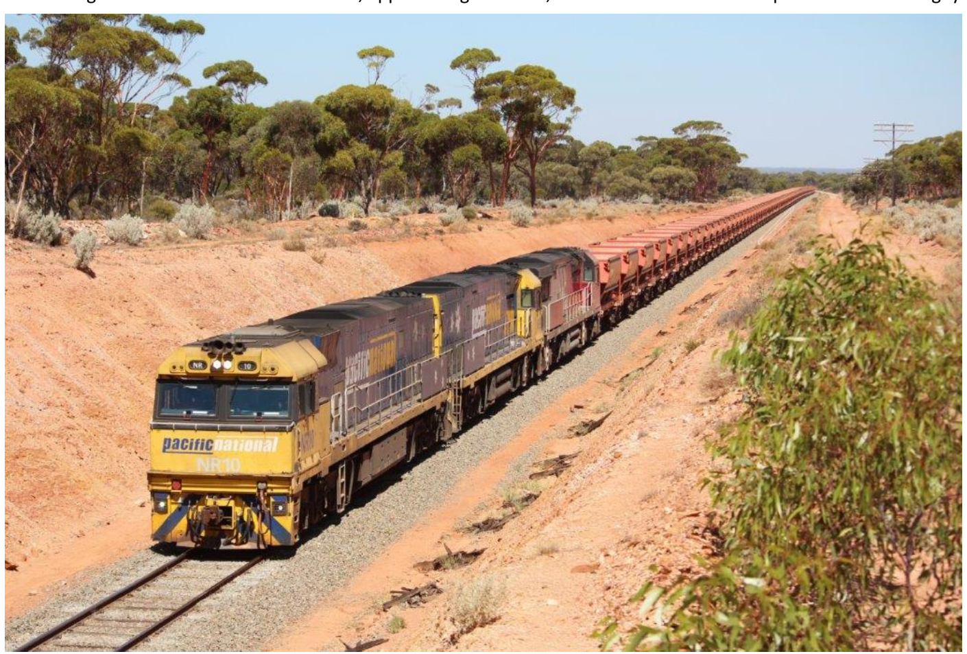
After three weeks as Esperance port shunter, NR10 leads NR69 & MRL001 on 1032 approaching Binduli, 3<sup>rd</sup> March. Page 2 of 31