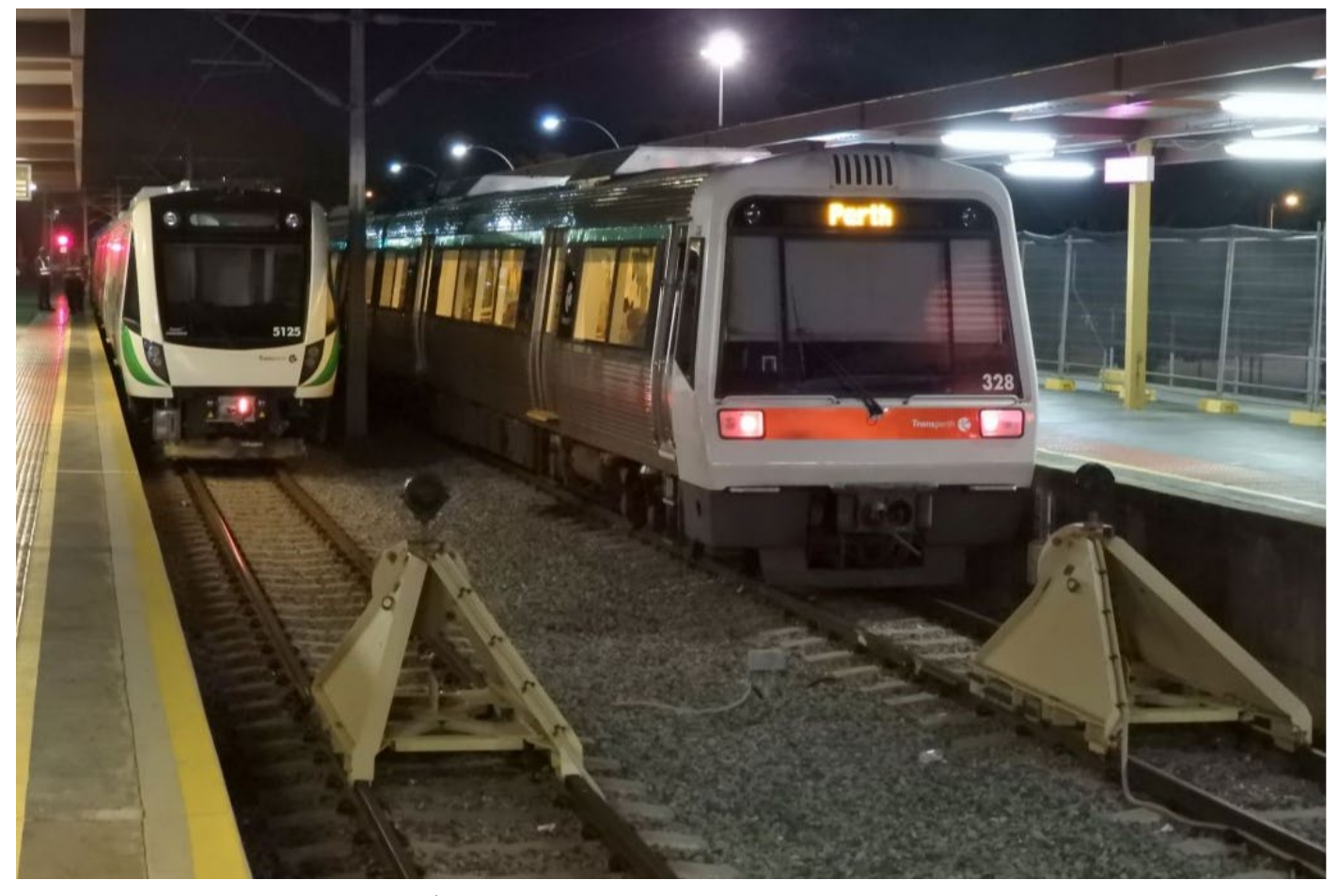
B set 125 beside A set 28, Midland, 8<sup>th</sup> March. Page 9 of 31