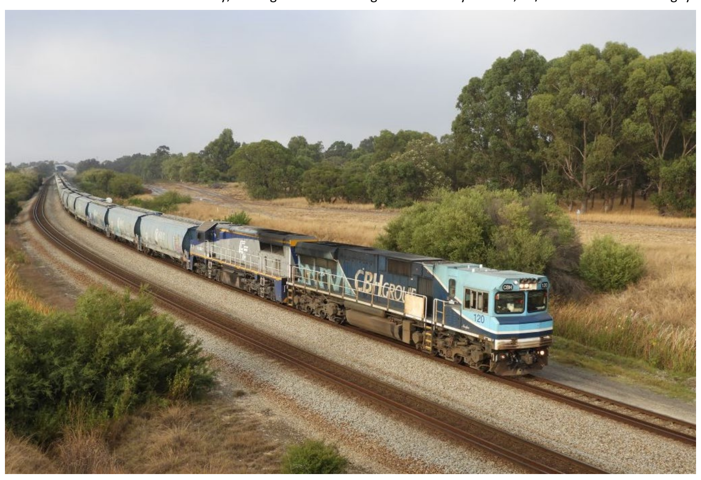
CBH120 leads VL361 on 7S51 empty grain, South Guildford, 16 ^{\rm th} March. Page {\bf 16} of {\bf 31}