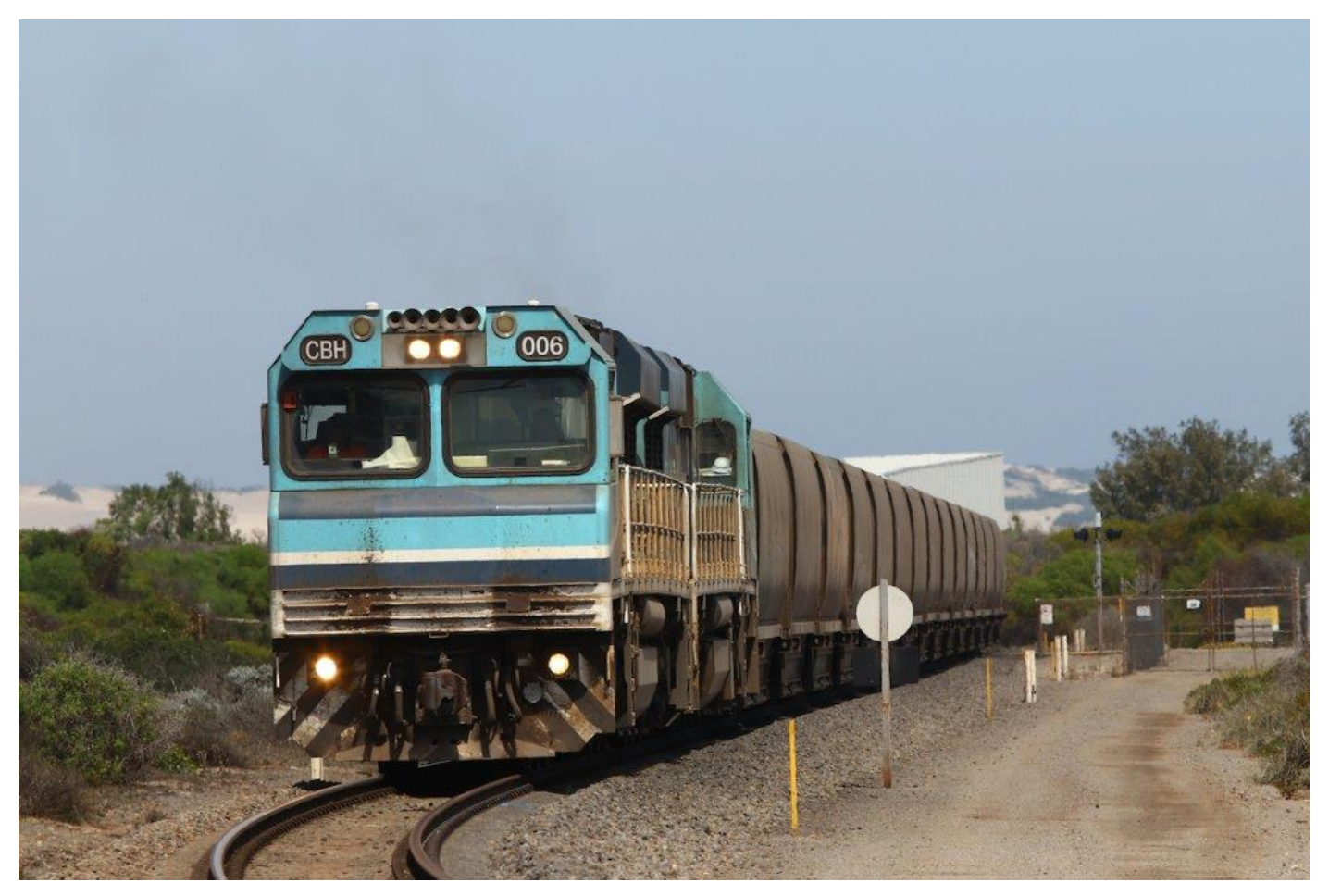
CBHs 006 & 025 haul 1G53 loaded grain through Beachlands, 10^{\text{th}} March.