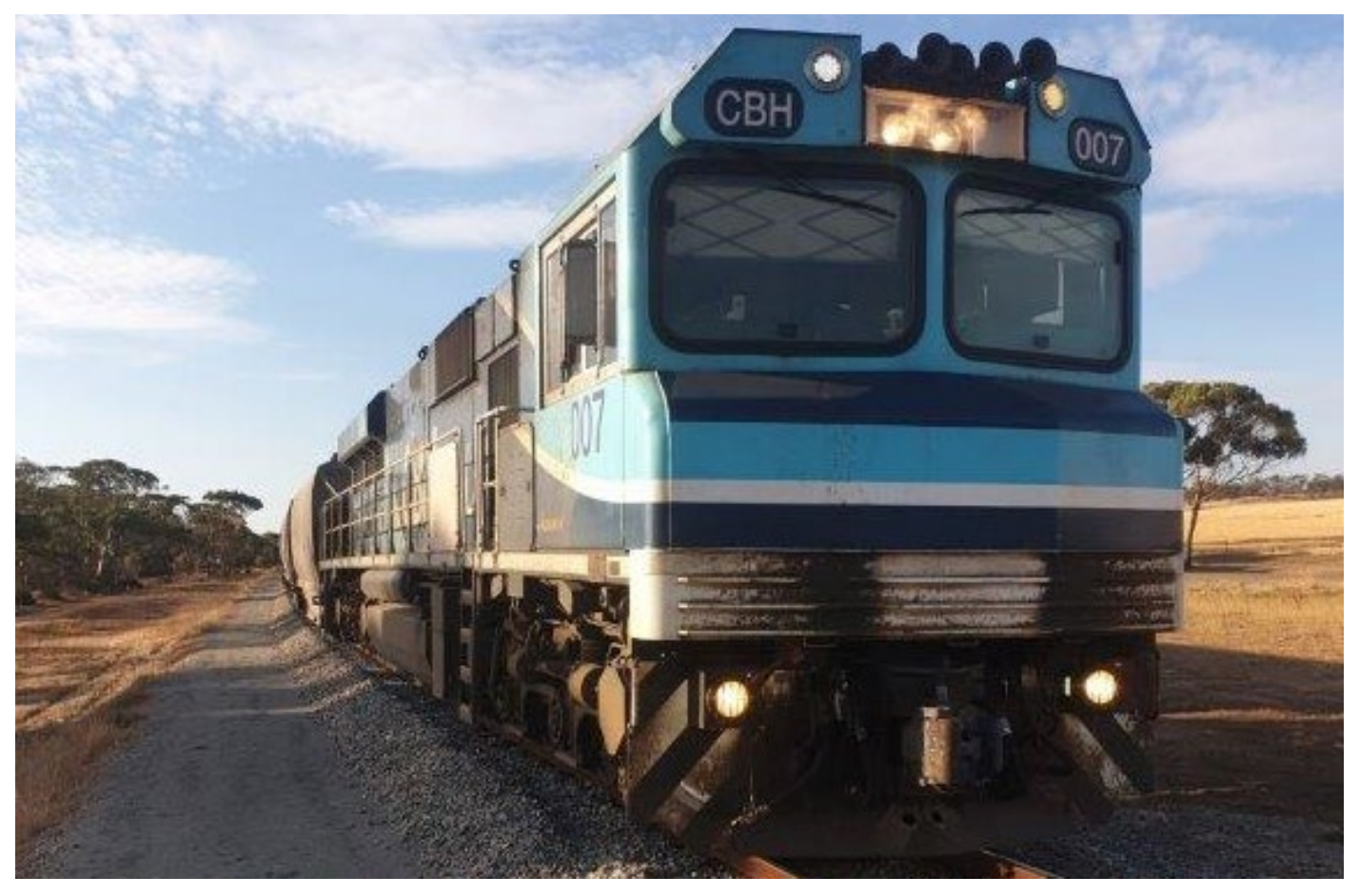
CBH007 heads 1K54 at Watheroo, 10<sup>th</sup> March.