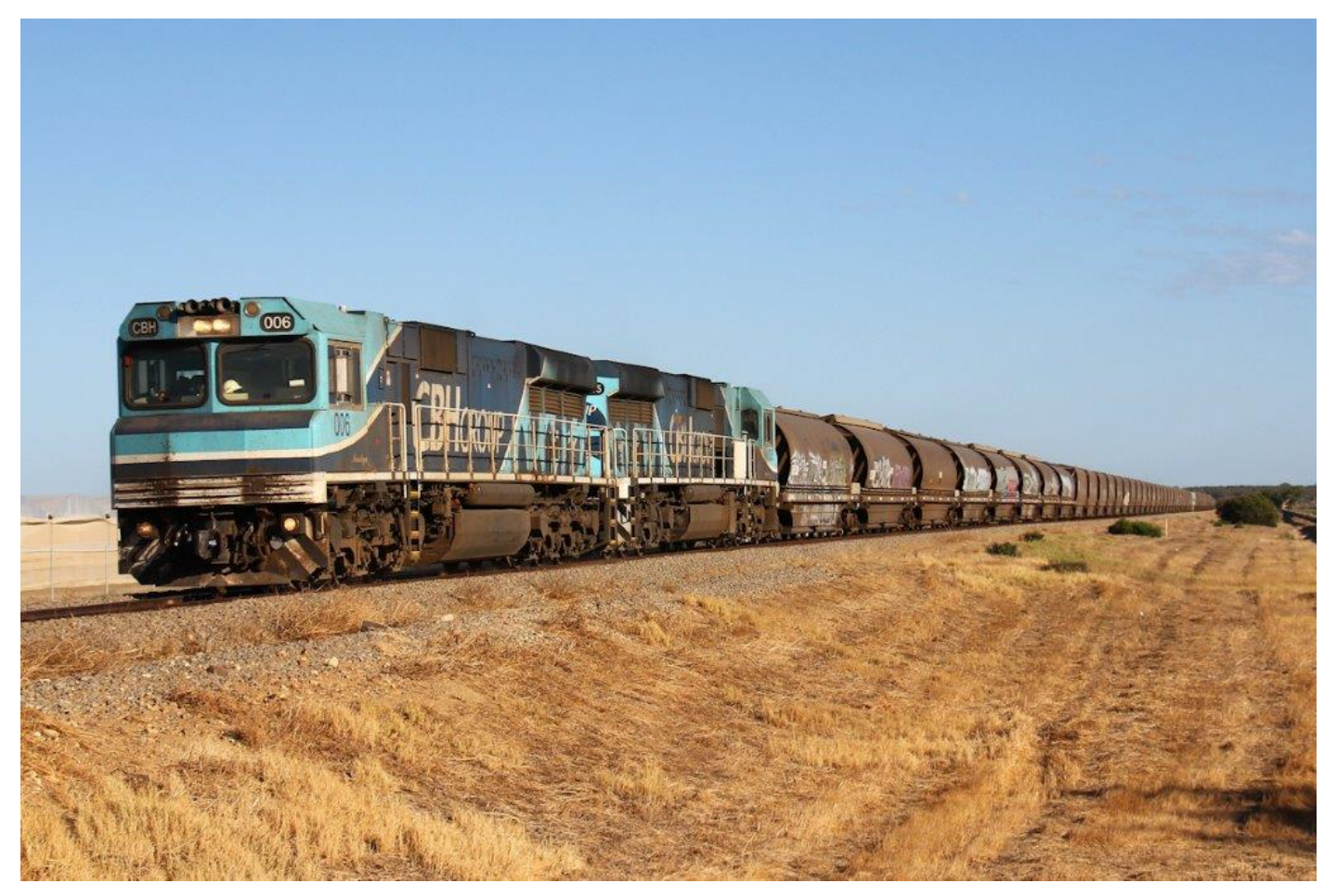
CBHs 006 & 005 on 3G50 empty grain, Bootenal, 26^{\text{th}} March.