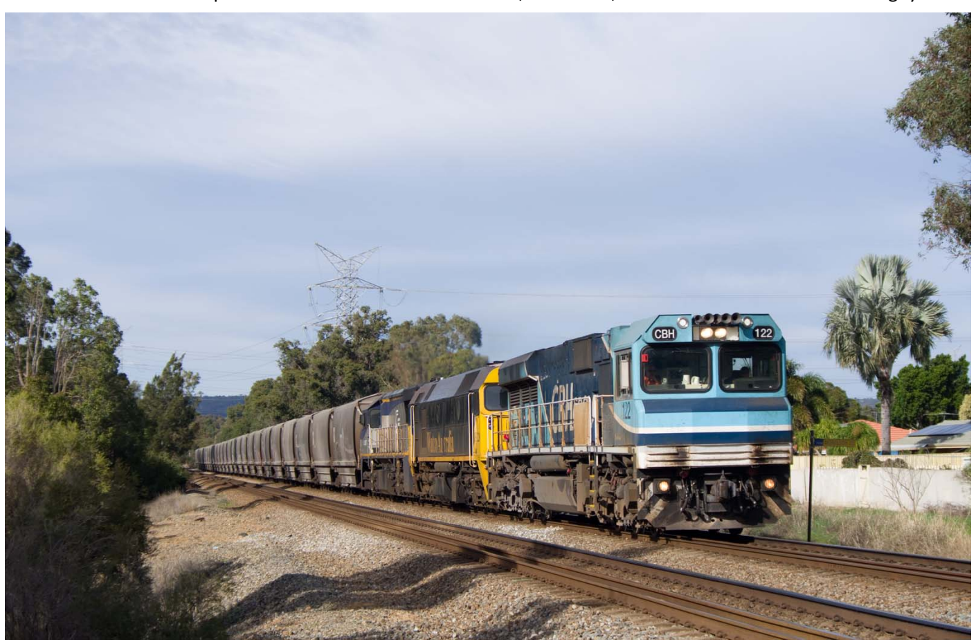
CBH122, FL220 & VL361 provide an unusual lashup on 5S51 through Swan View, 20^{th} June.