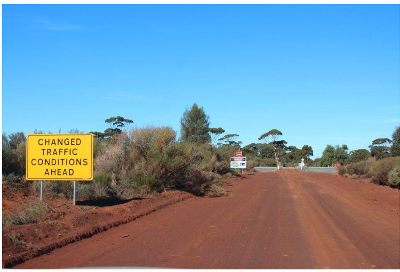
A haulroad for KCGM has been built over the rail and access track near Parkeston, 1<sup>st</sup> June. Page 4 of 27