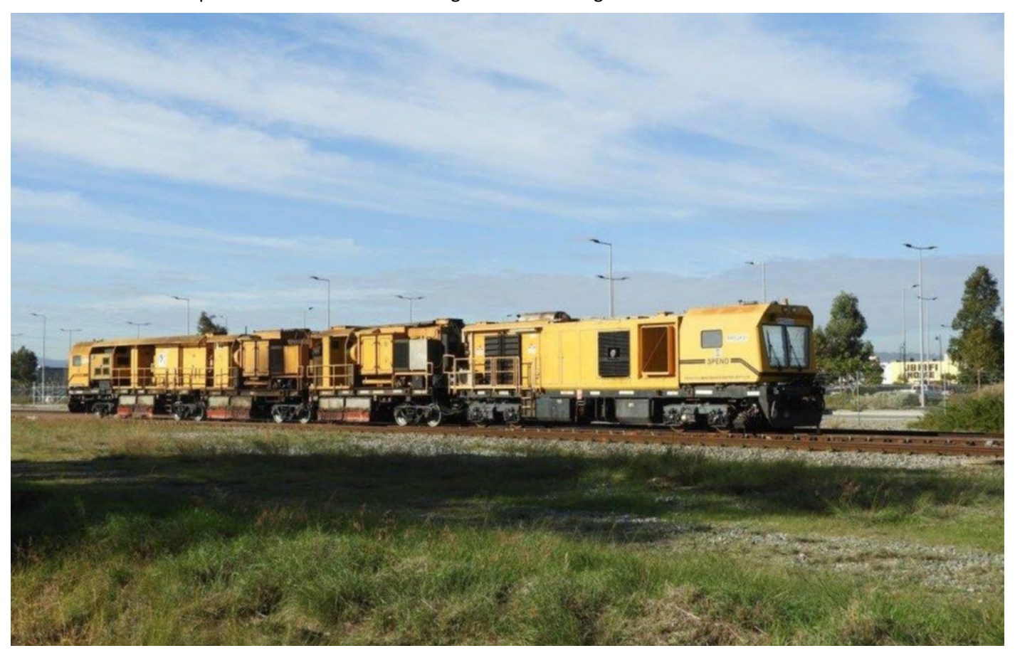
Standard gauge Speno rail grinder RRD2430 at Midland, June 18^{\text{th}} .