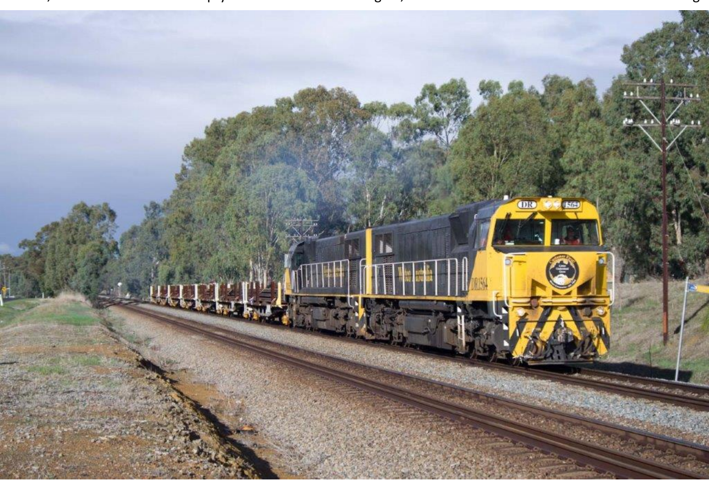
DRs 1564 & 1565 work 6RT1 rail train through Middle Swan on 14^{\rm th} June. Page 16 of 27