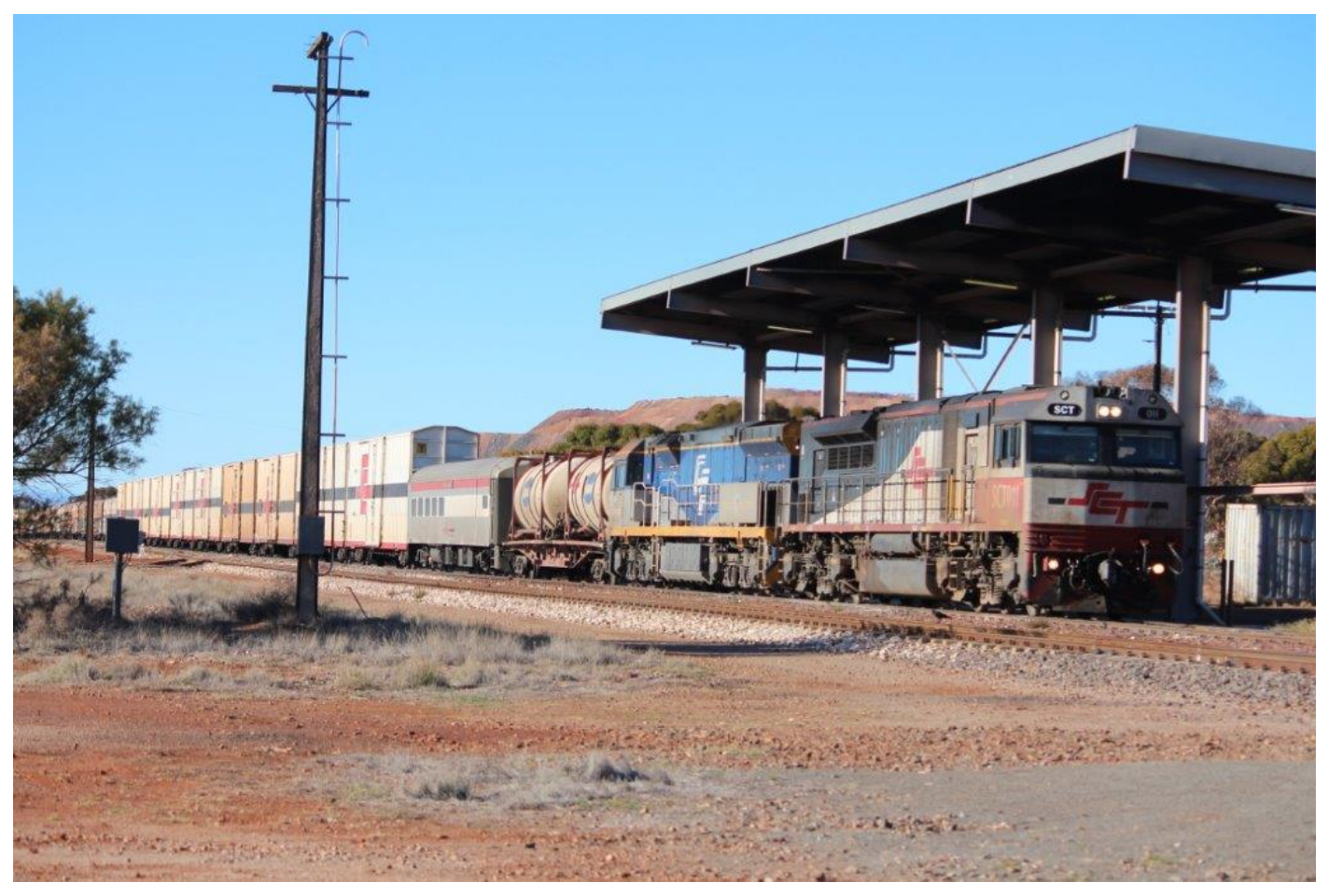
SCT011 & CF4410 team up on 7GP1, Parkeston, 3^{\rm rd} June.