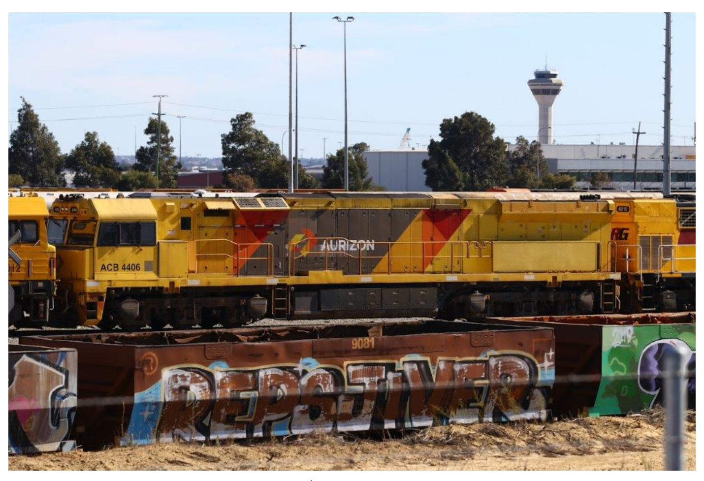
Q4012, ACB4406 & Q4010 stored at Forrestfield, 3<sup>rd</sup> June.