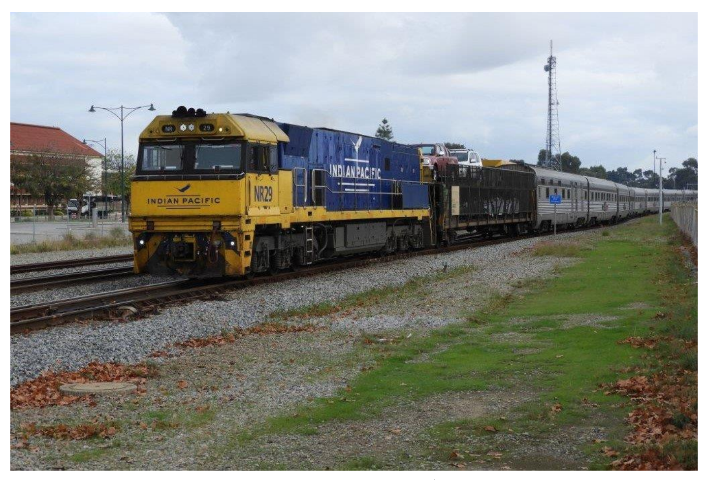
With a suitably liveried NR29 leading, 1PA8 rolls through Midland on 16<sup>th</sup> June.