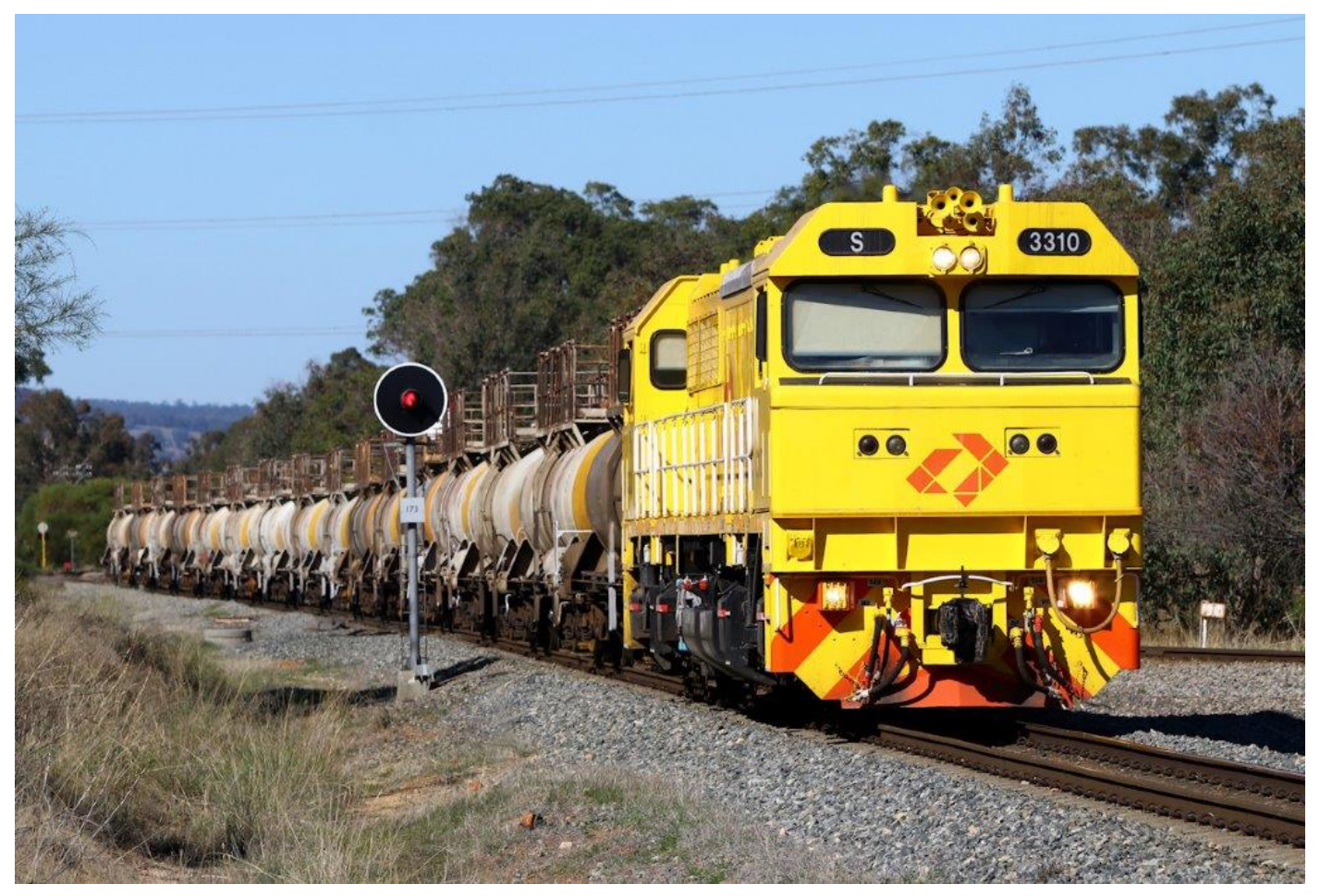
Corporate-liveried S3310 leads 1238 empty caustic tanks at Pinjarra East, 2<sup>nd</sup> June.