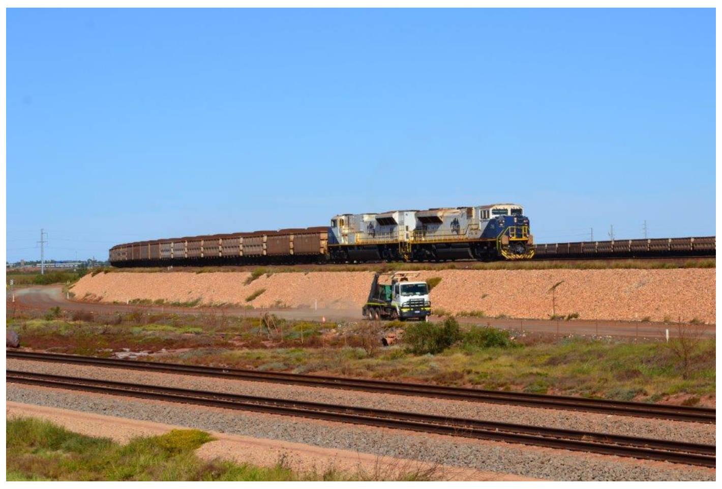
A loaded FMG rake climbs towards the car dumpers behind 705 & 901, 1st June.