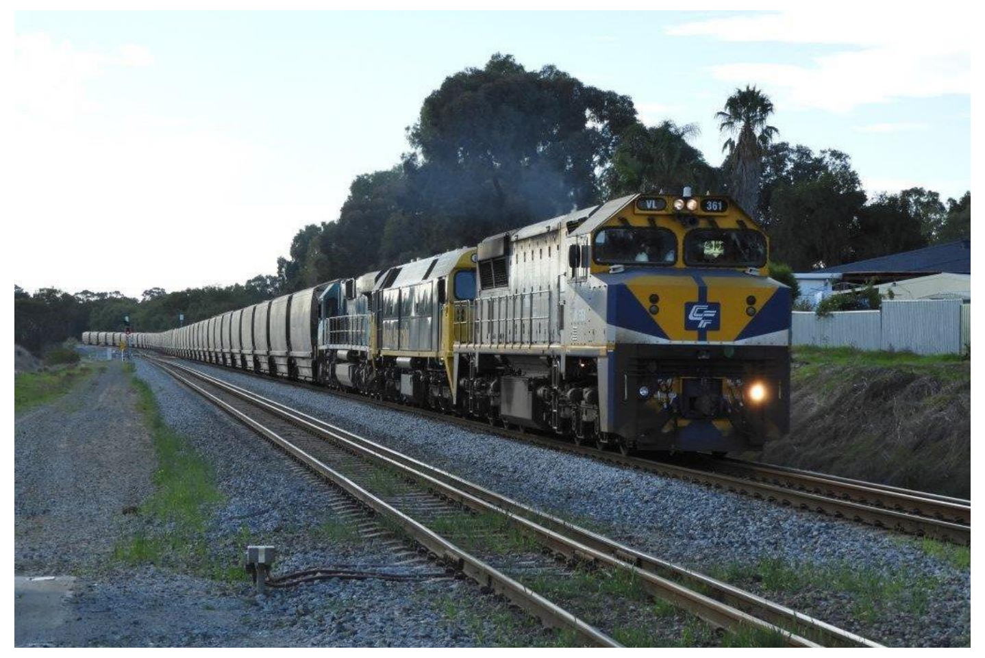
VL361, FL220 & CBH122 rumble through Hazelmere on 6S56 Watco grain, 21st June.