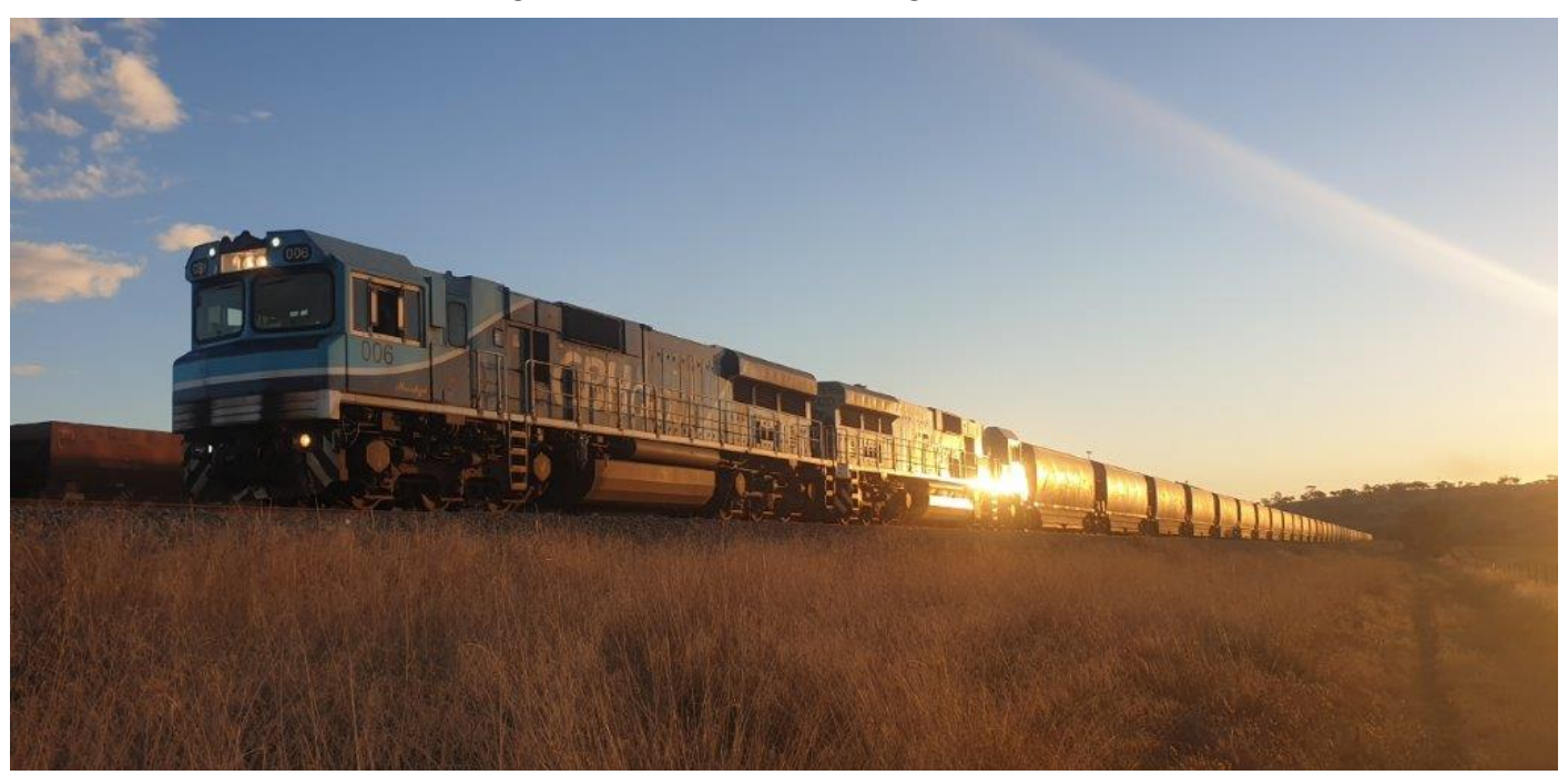
CBHs 006 & 003 on 6K23 await a fresh crew at Avon Yard before running to Pithara to load, 21st June.