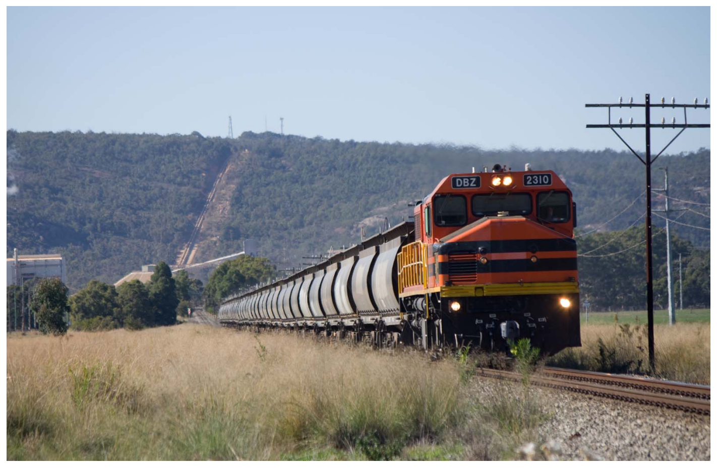
DBZ2310 on 1873 loaded alumina at Calcine (above) and Pinjarra East (below), 2<sup>nd</sup> June.