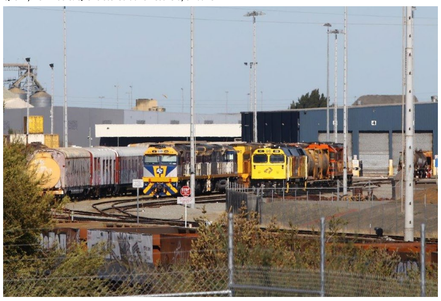
CFs 4406 & 4405 sit with stored ACC6031, DC2208 and an L at Forrestfield, 3<sup>rd</sup> June.