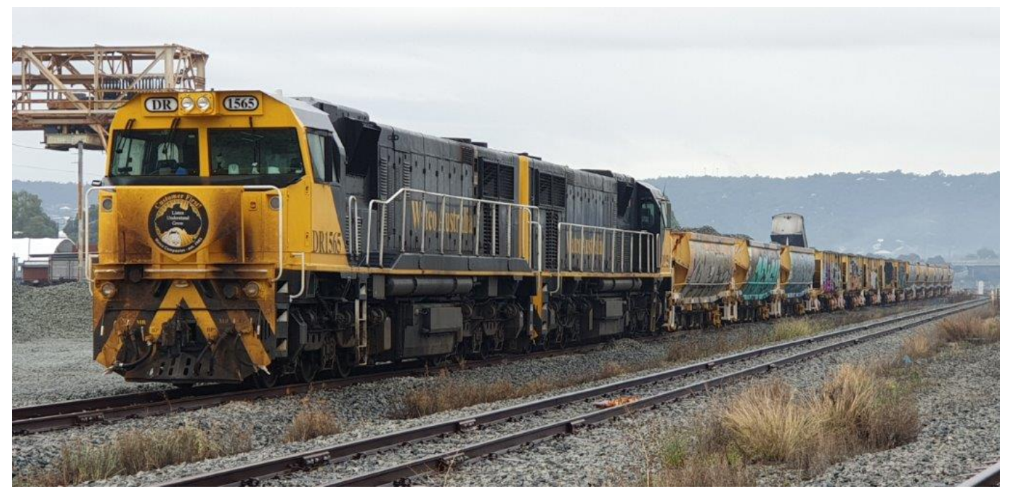
Watco's DRs 1565 & 1564 stabled at Midland's Flashbutt siding, 13<sup>th</sup> June.