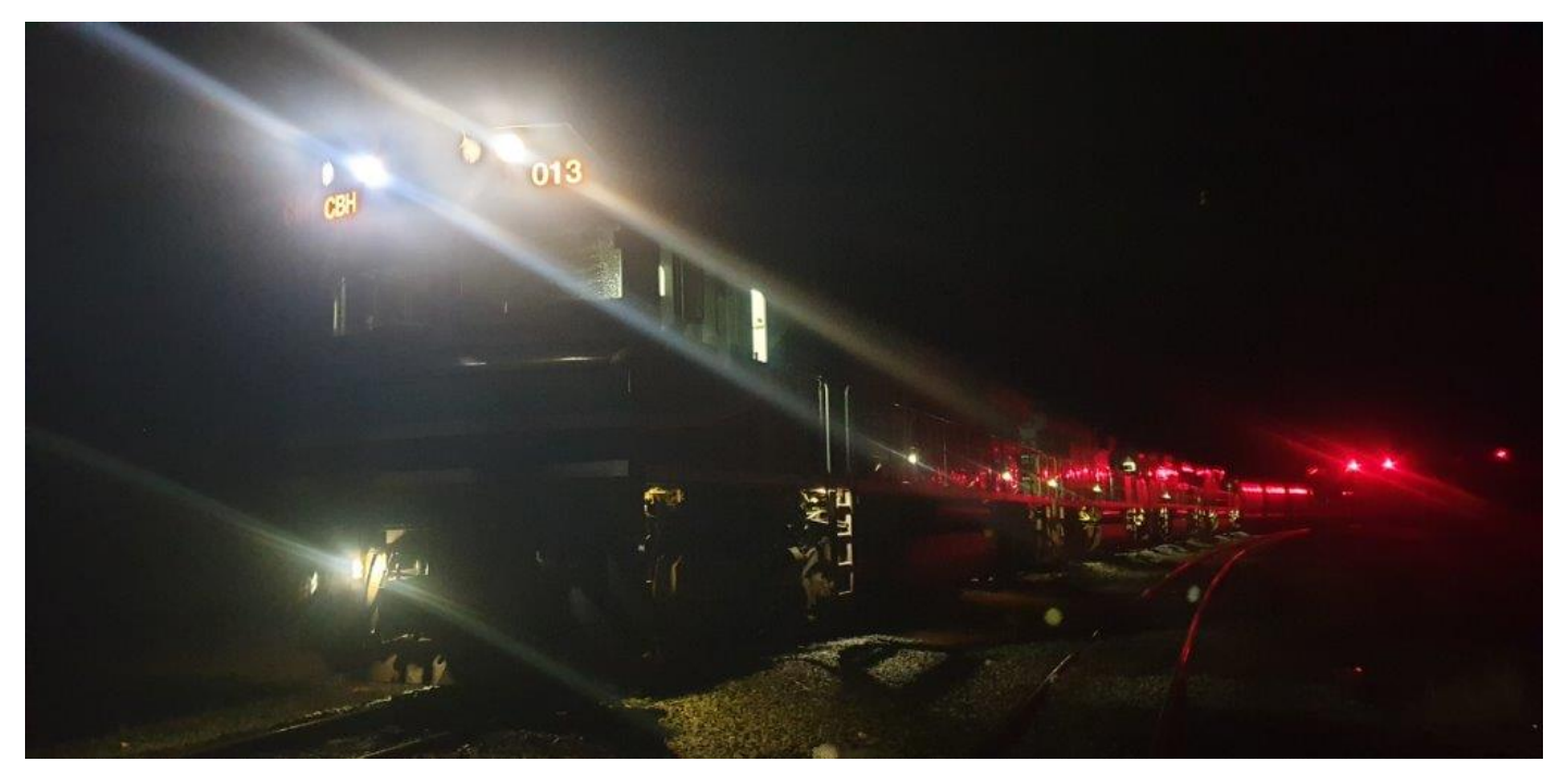
CBHs 013, 002, 014 & 015 on 2K64 from Koorda await crew change, Avon Yard, 10^{\text{th}} June.