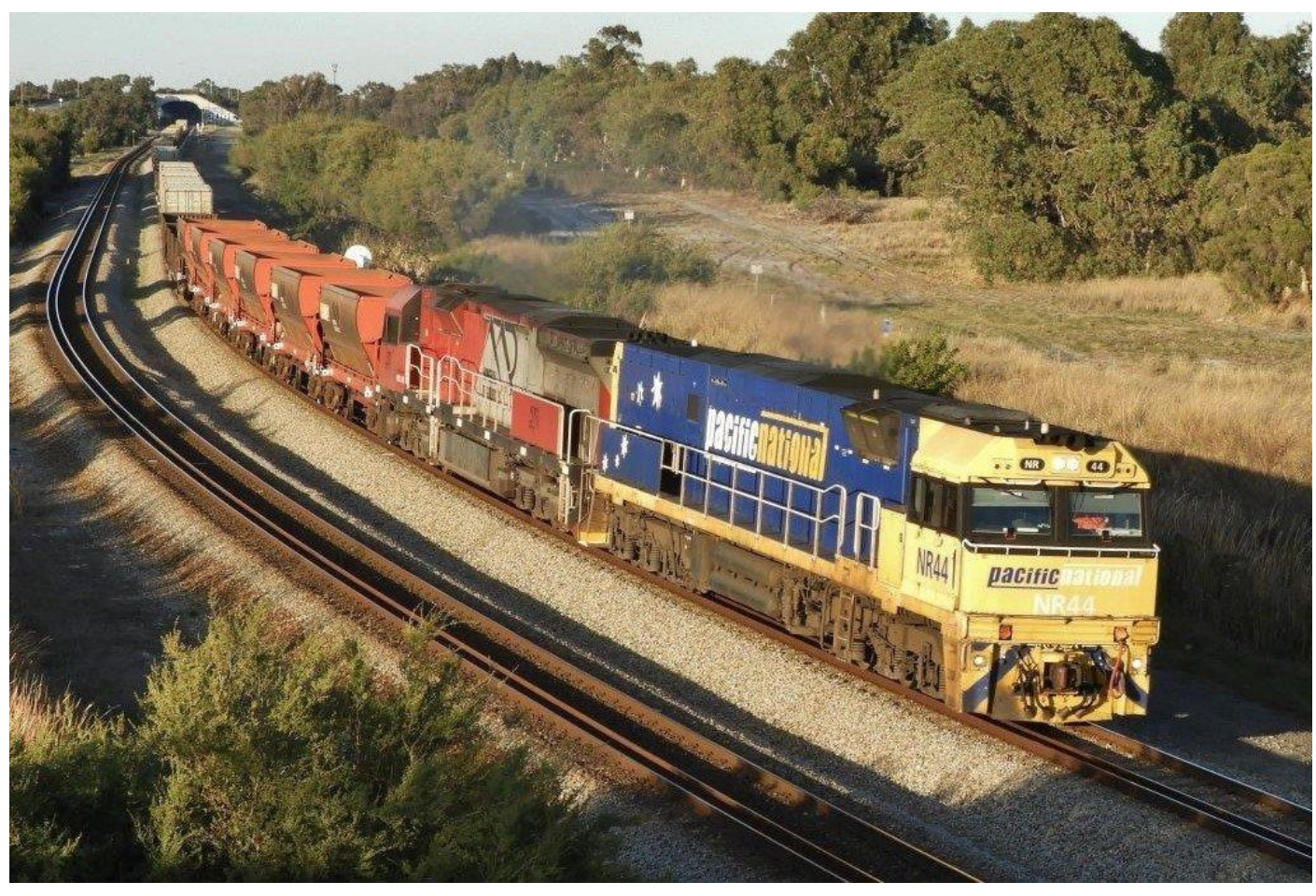
MRL002 and hoppers on transfer back to Esperance by NR44 on 7PX4, South Guildford, 1st June. Page 3 of 27