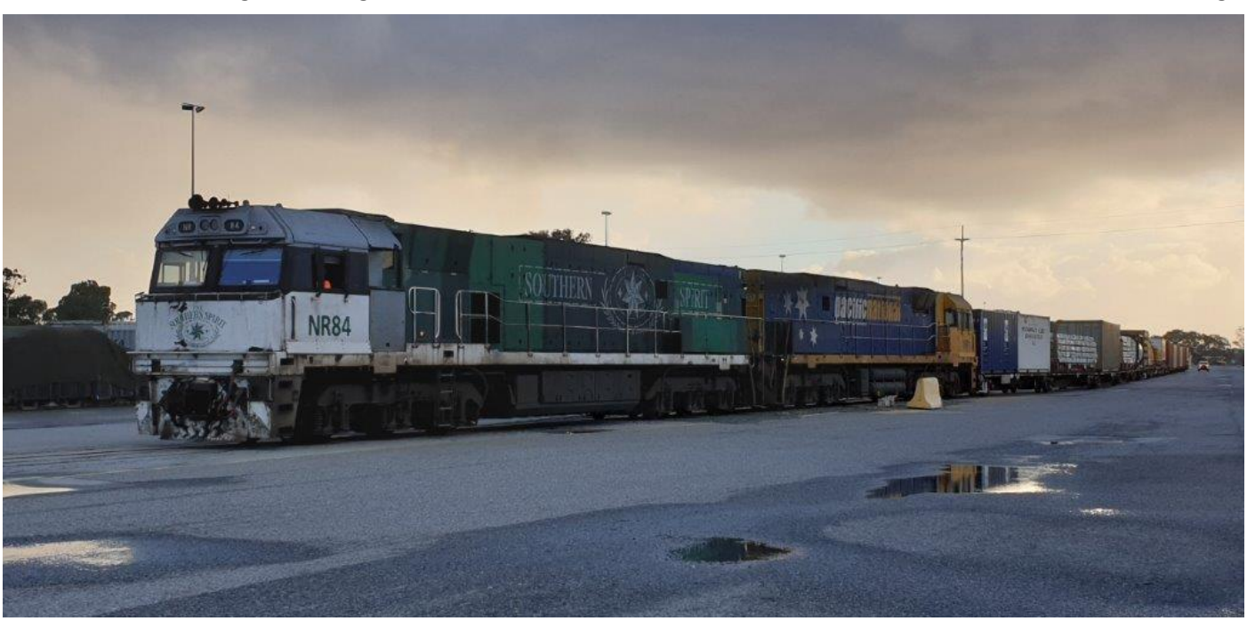
NRs 84 & 1 shunt 1PM5 at Perth Freight Terminal, Kewdale, 9<sup>th</sup> June. NR84 is now the only unit wearing the Southern Spirit colour scheme.