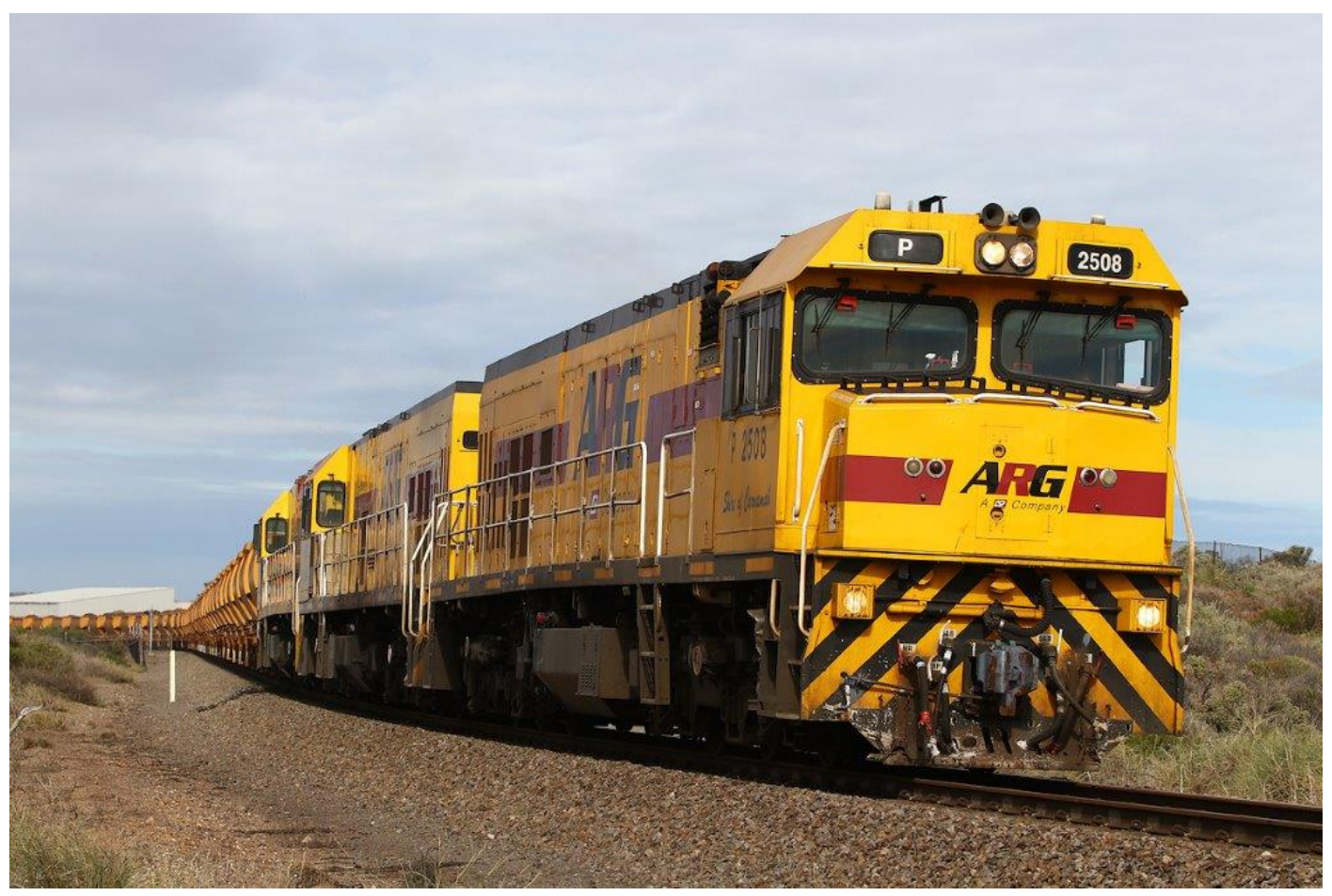
Ps 2508, 2502 & 2504 on 7721 loaded Mt Gibson ore at Beachlands, 16^{\text{th}} June.