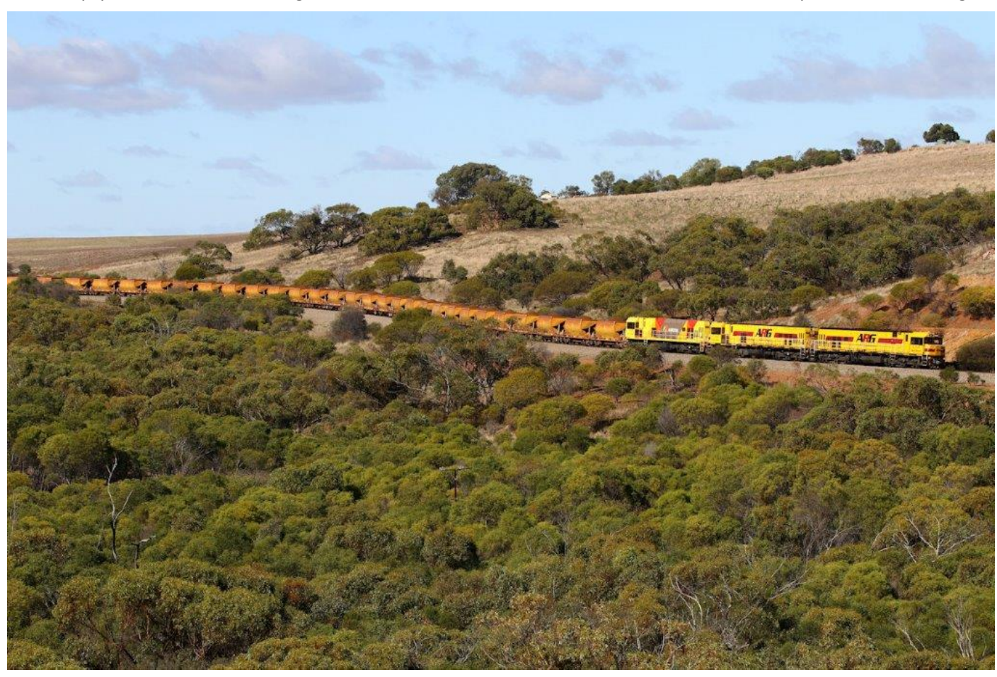
Ps 2508, 2502 & 2504 roll through the hills at Bringo with 7721 Mt Gibson ore, 15^{th} June. Page 17 of 27