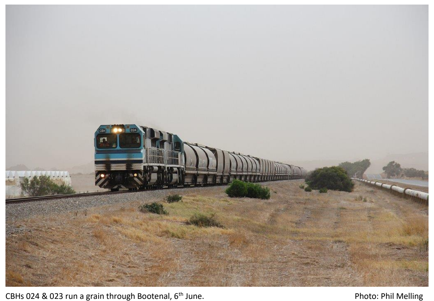
CBHs 024 & 023 run a grain through Bootenal, 6<sup>th</sup> June.