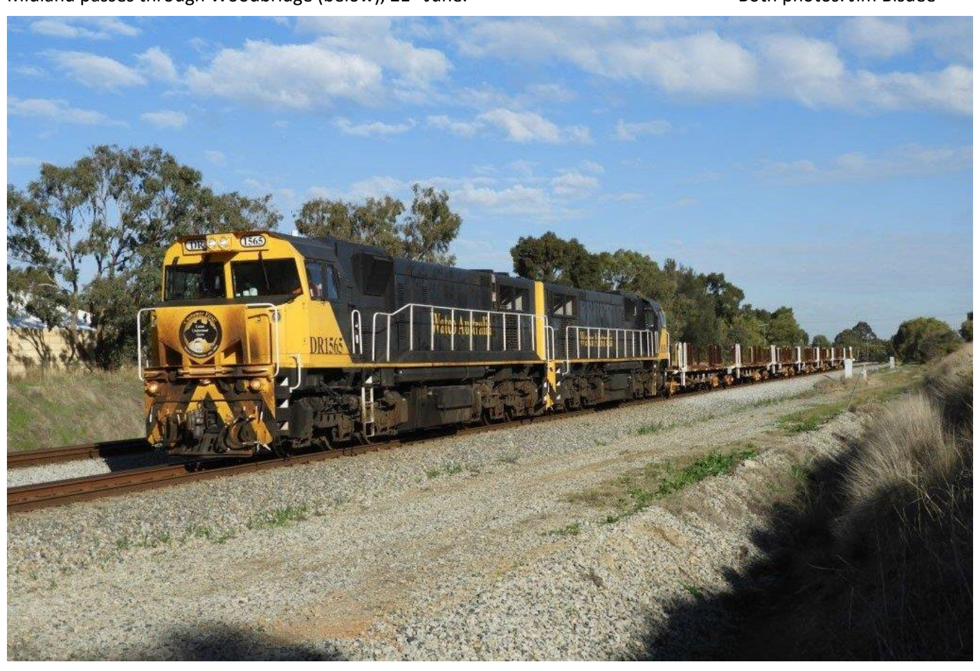
Page 24 of 27