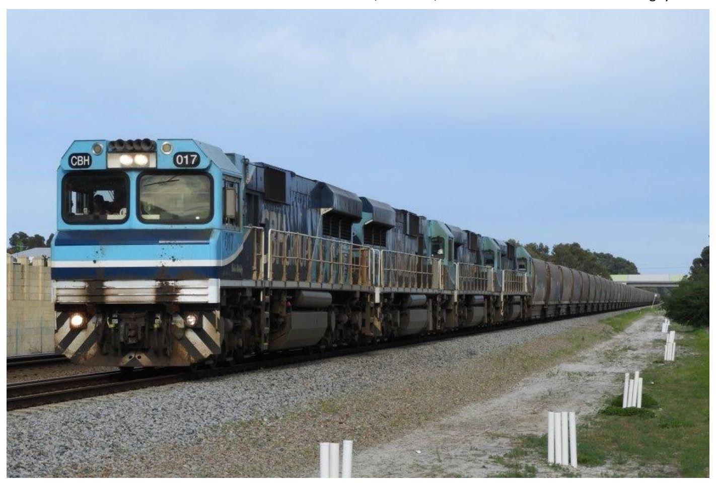
CBHs 017, 015, 010 & 023, 7K63 empty grain, Thornlie; lead unit to detach at Forrestfield. 22/6. Page 26 of 27