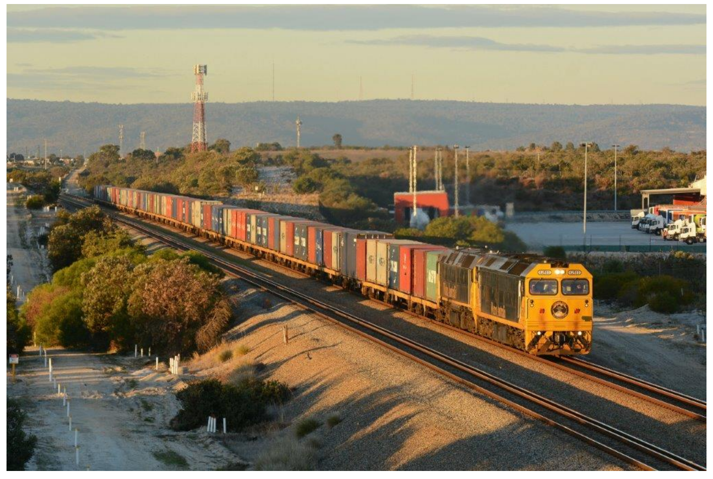
The setting sun catches G511 & HL203 on 7146 at Jandakot, 18<sup>th</sup> May.