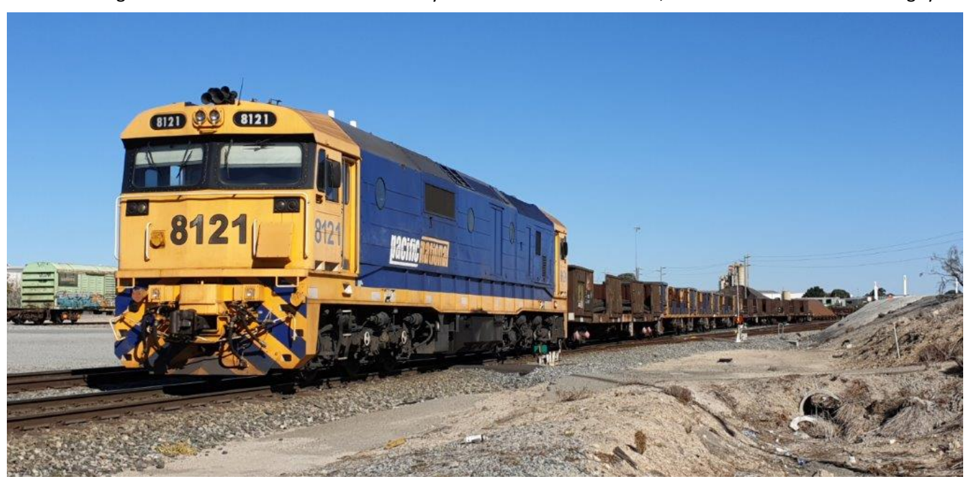
8121 prepares to shunt Perth Freight Terminal, 4<sup>th</sup> June.