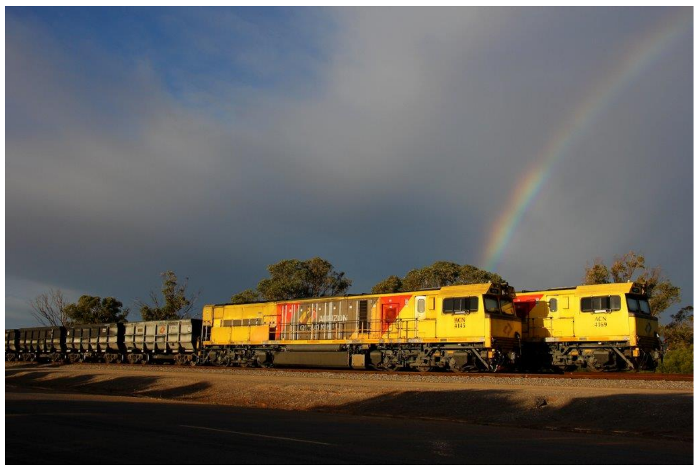
A rainbow reveals its pot of gold to be ACNs 4145 and 4149 stabled on their Karara ore trains at Narngulu, 14<sup>th</sup> June.