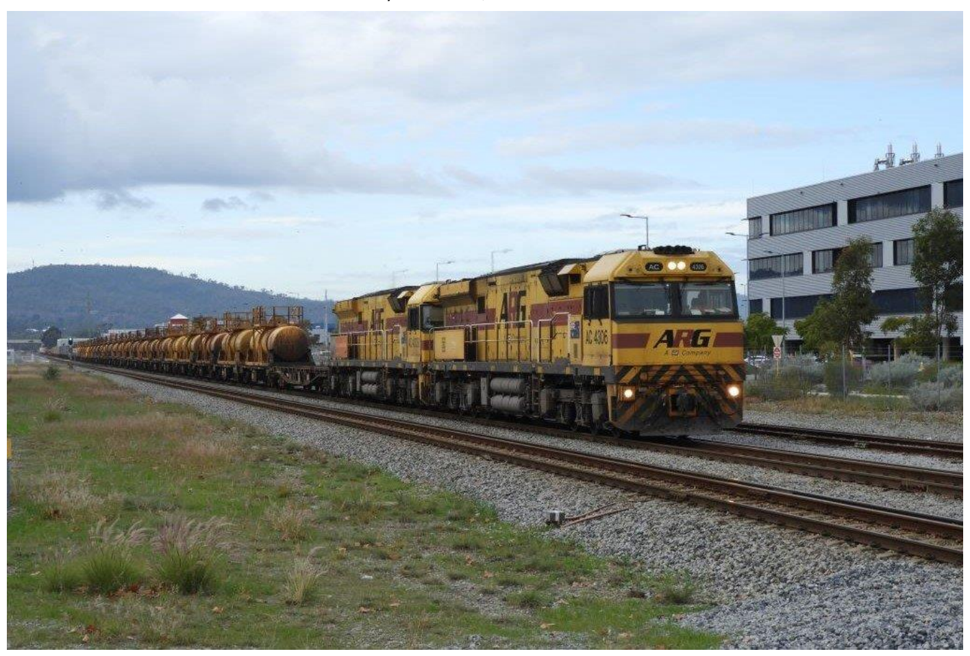
ACs 4306 & 4308 lead a late 7426 ex Kalgoorlie through Midland, 16^{th} June. Page 18 of 27