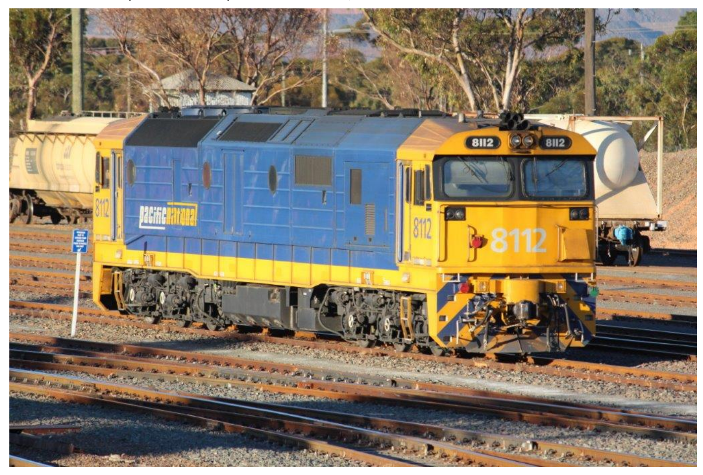
Regular Acacia Ridge shunter 8112 in West Kal yard, 19<sup>th</sup> June, arrived the previous night. Page 22 of 27