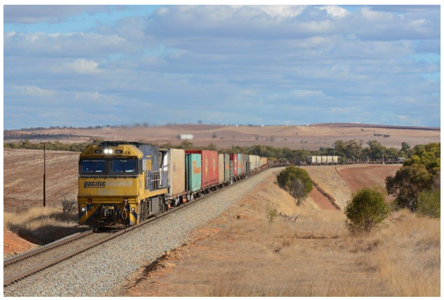
NR47 leads 7PX4 through the hills at Grass Valley, 18<sup>th</sup> May.