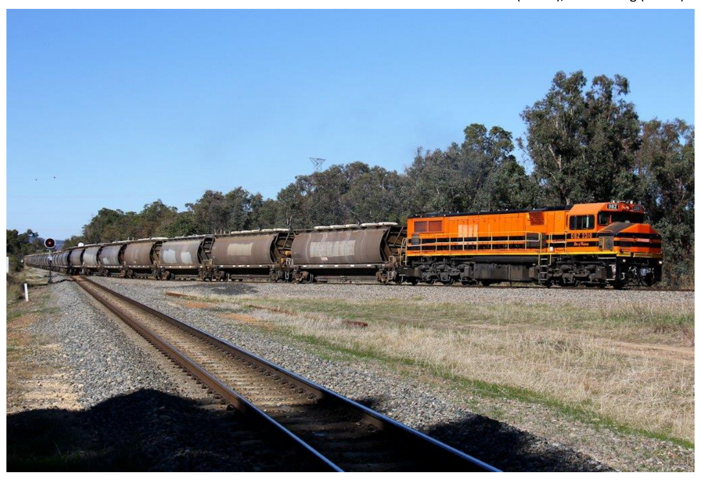
Page 8 of 27