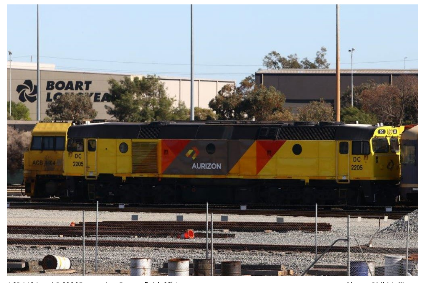
ACB4404 and DC2205 stored at Forrestfield, 3<sup>rd</sup> June.