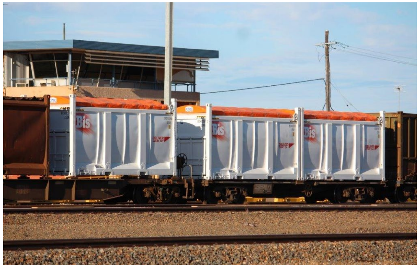
BIS trialled two new sulphur containers earlier this year and has now introduced a couple of dozen into regular use. Three CIMC-built BICN containers are seen in a block on 6029, West Kal, 22<sup>nd</sup> June.