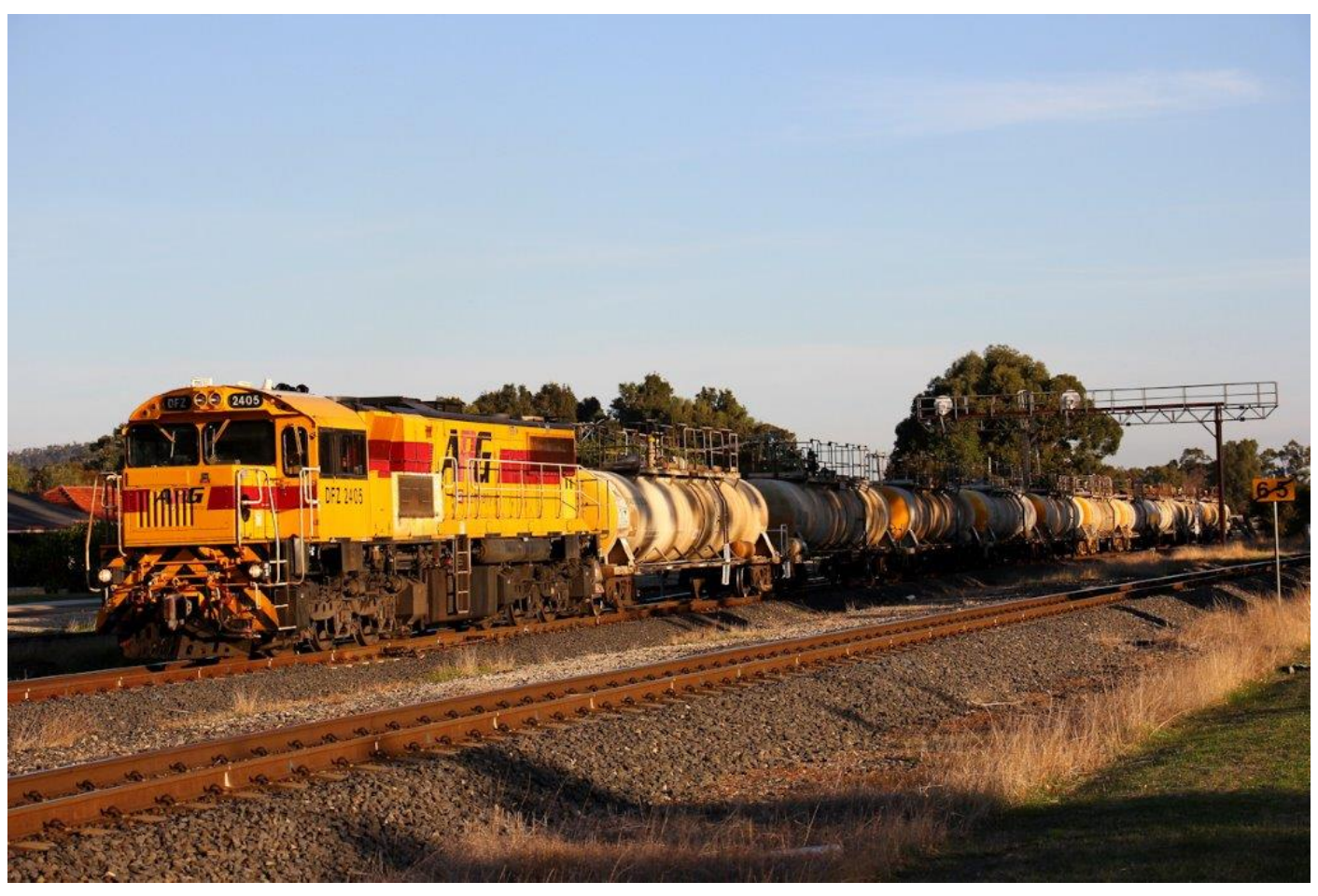
7294 loaded caustic passes through Brunswick Junction behind DFZ2405, \mathbf{1}^{\text{st}} June.