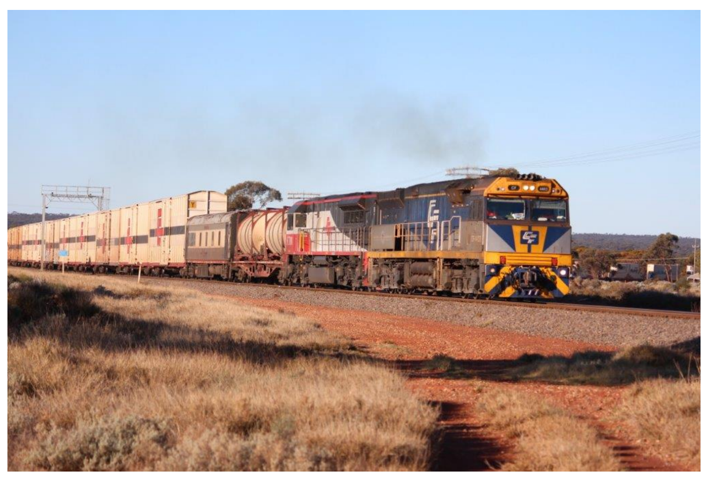
CF4403 & freshly overhauled + repainted SCT001 depart Parkeston with 5MP9, 1st June.