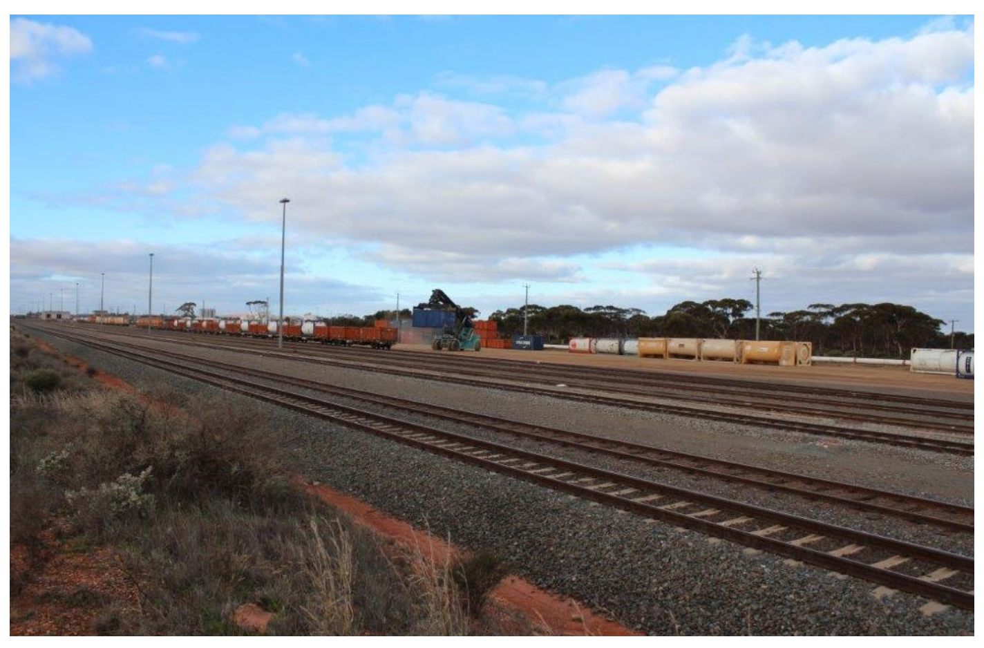
Infrastructure work on the gantry roads at West Kalgoorlie saw container transfers for 025/426 undertaken on Black Swan road for almost two weeks. Wagons are being loaded for 4426 on 17<sup>th</sup> July.