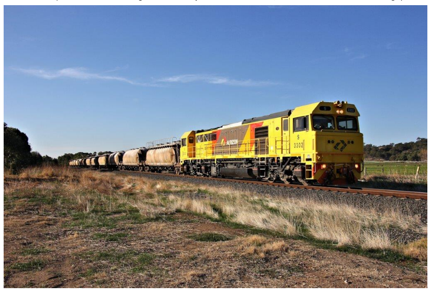
S3302 works 7271 loaded lime through Wokalup, \mathbf{1}^{\text{st}} June.