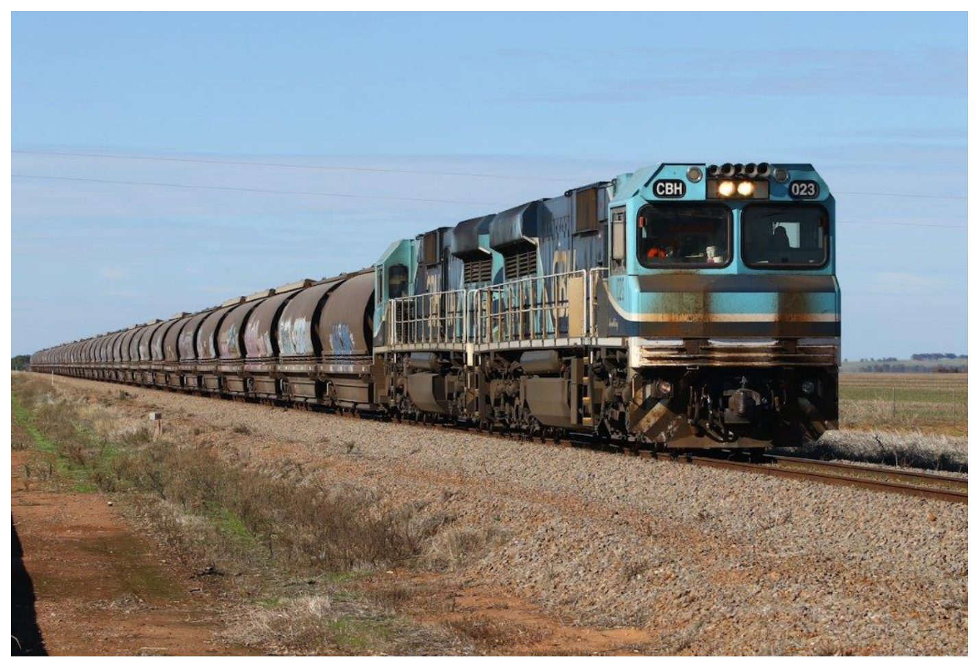
CBHs 023 & 011 operate 7G53 loaded grain through Georgina, 22<sup>nd</sup> June.