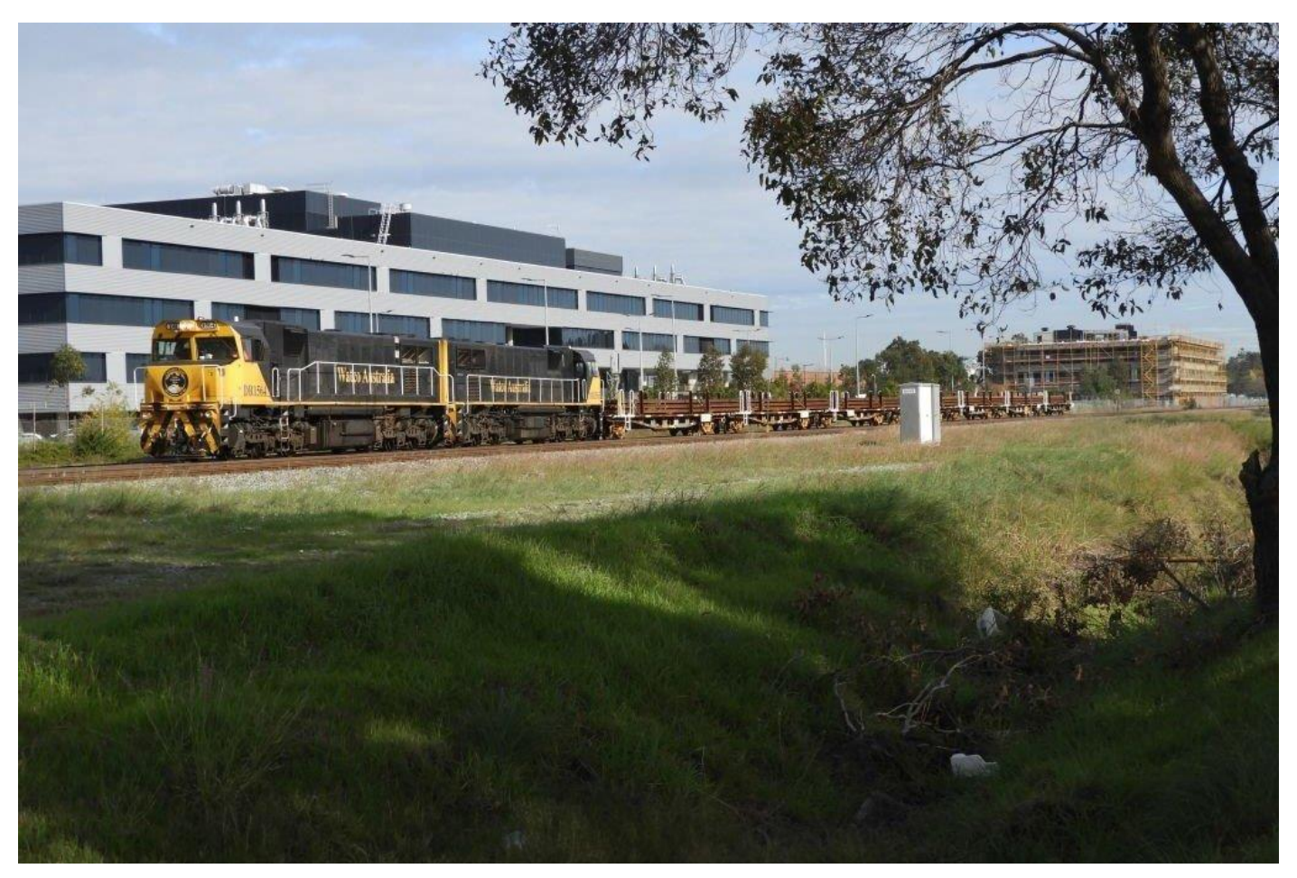
DRs 1564 & 1565 depart Midland loop with 3RT1 rail train, 18<sup>th</sup> June.