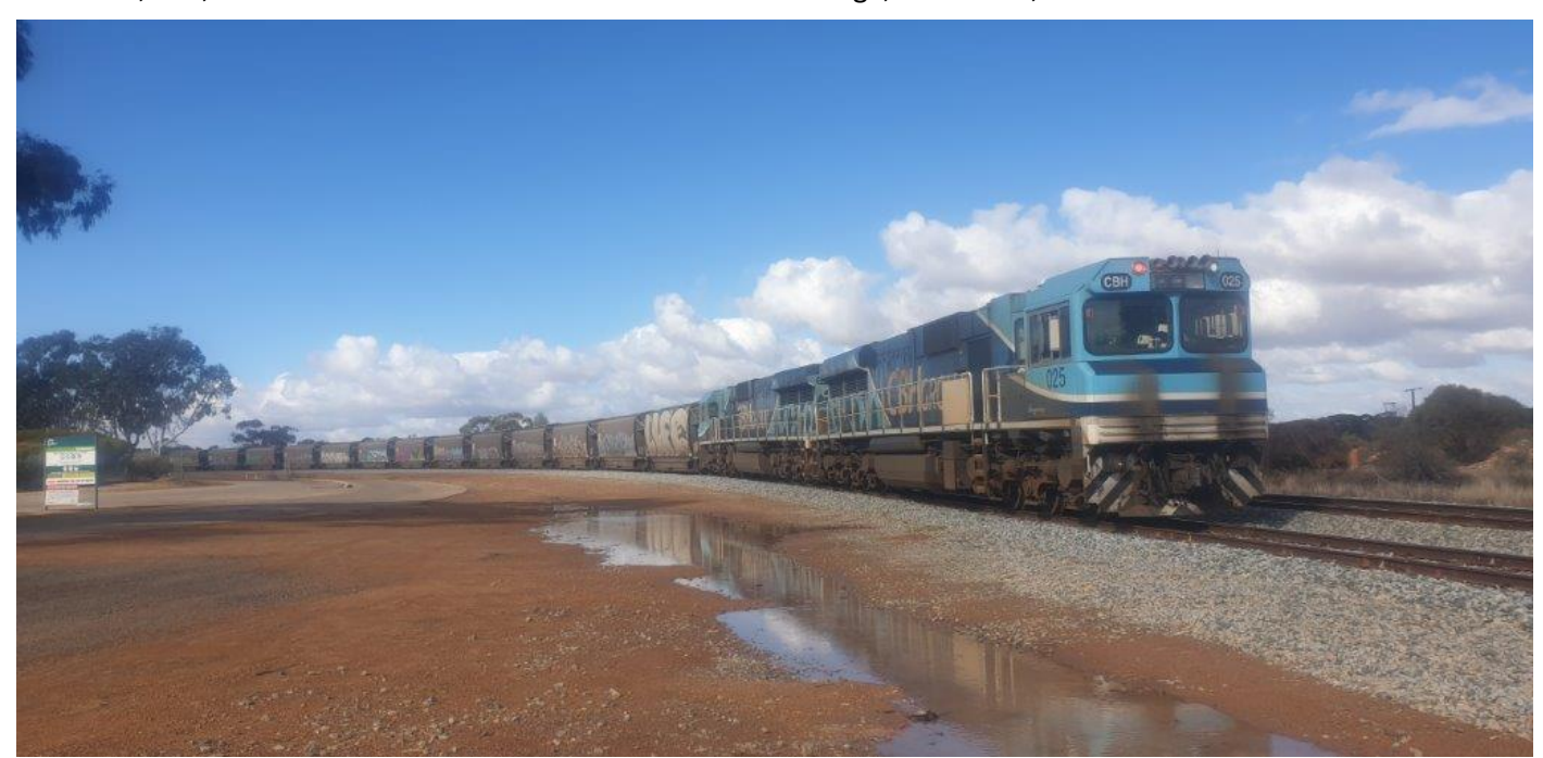
CBHs 025 & 007 wait to cross 4K63 before departing Wyalkatchem on 4K66, 12<sup>th</sup> June.