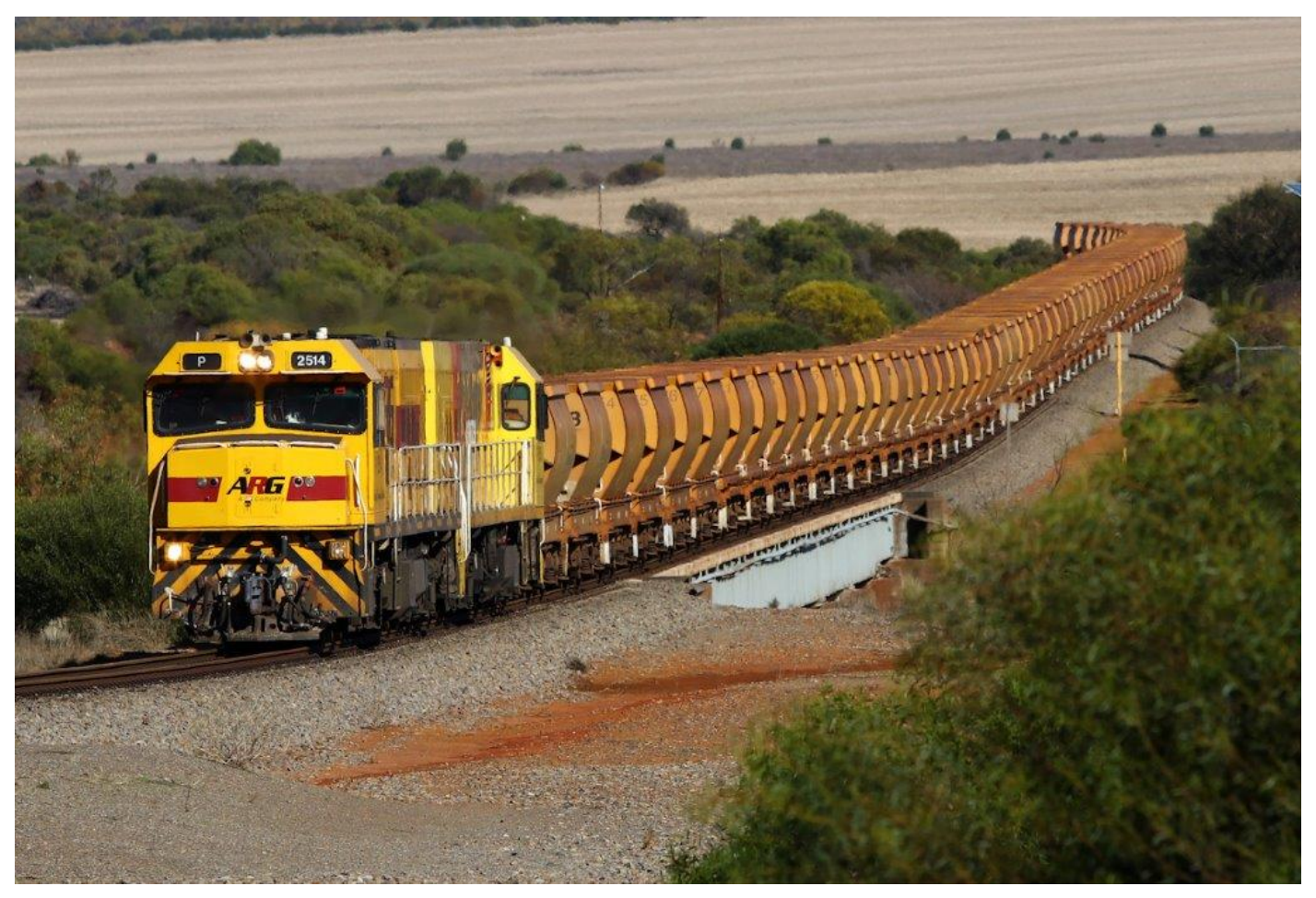
7720 empty Mt Gibson runs through Erad behind Ps 2514 & 2506, 15<sup>th</sup> June.