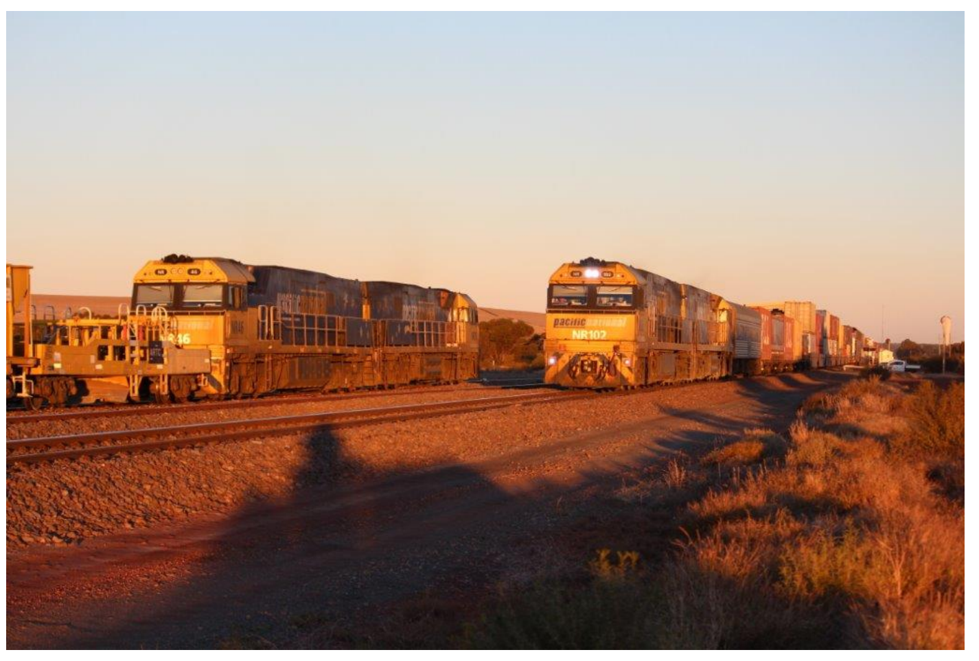
NRs 102 & 88 lead 2MP5 past NRs 78 & 46 on the ARTC ballast, Parkeston, 19<sup>th</sup> June.