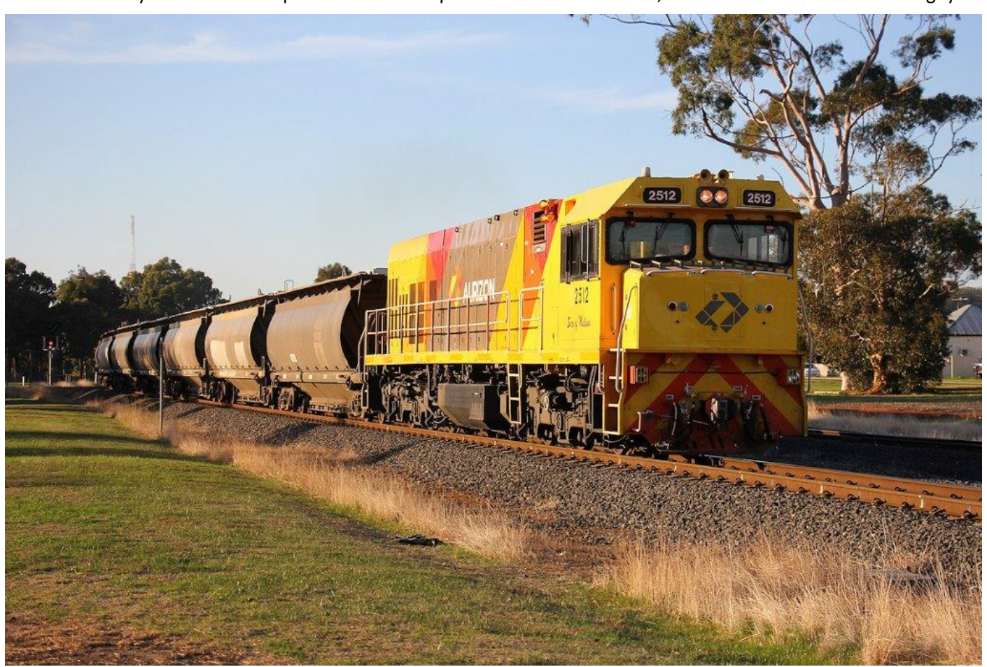
(P)2512 hauls 7875 loaded alumina through Brunswick Junction, \mathbf{1}^{\text{st}} June.