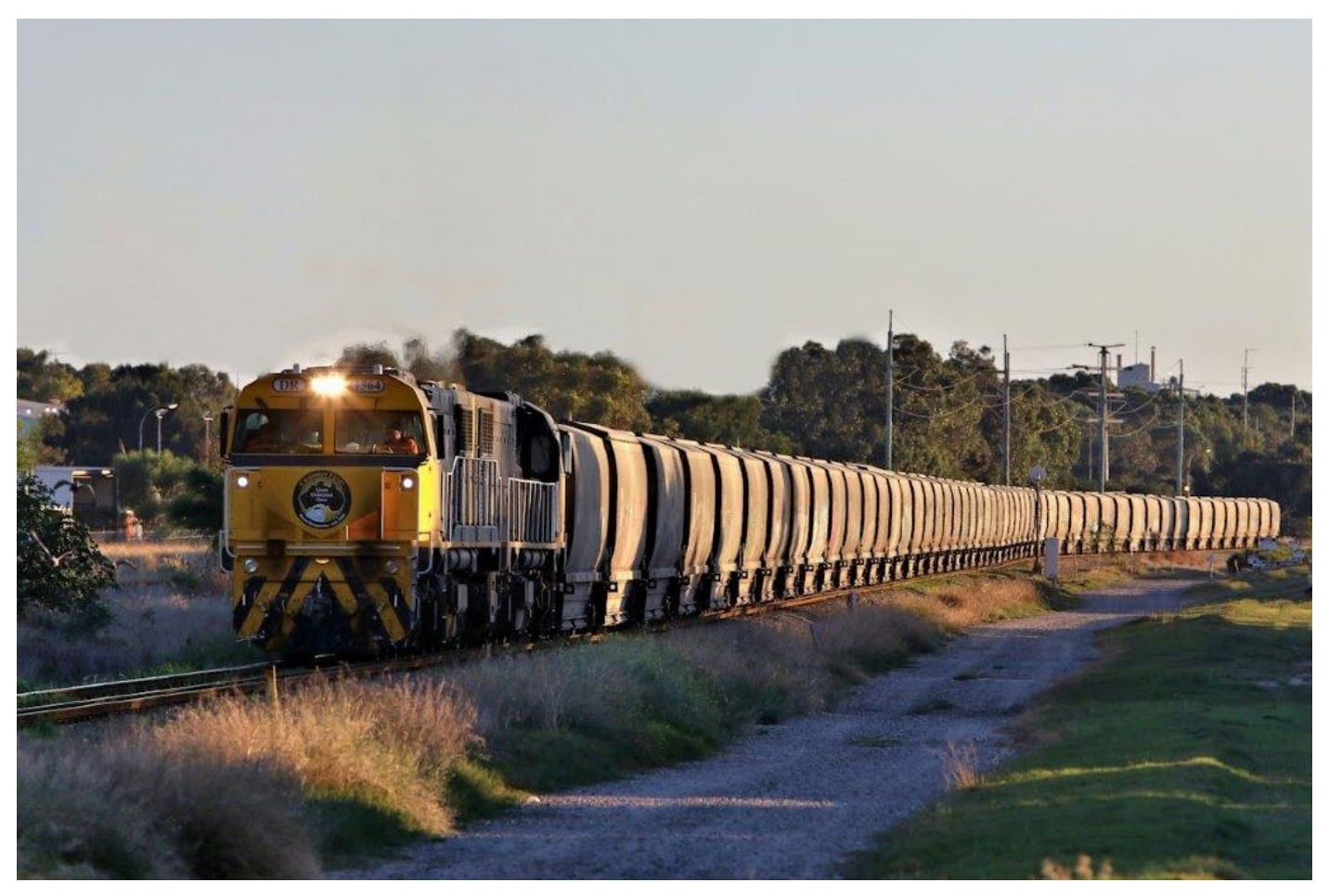
DRs 1564 and 1565 head 6K06 at Kwinana, 1st June.