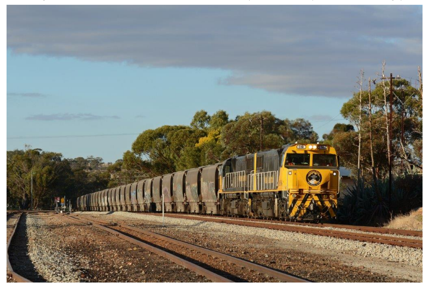
3 \text{K} 64 \text{ from Wyalkatchem to Kwinana passes through Goomalling behind DRs 1564 \& 1565, } 21^{\text{st}} \text{ May.} \\