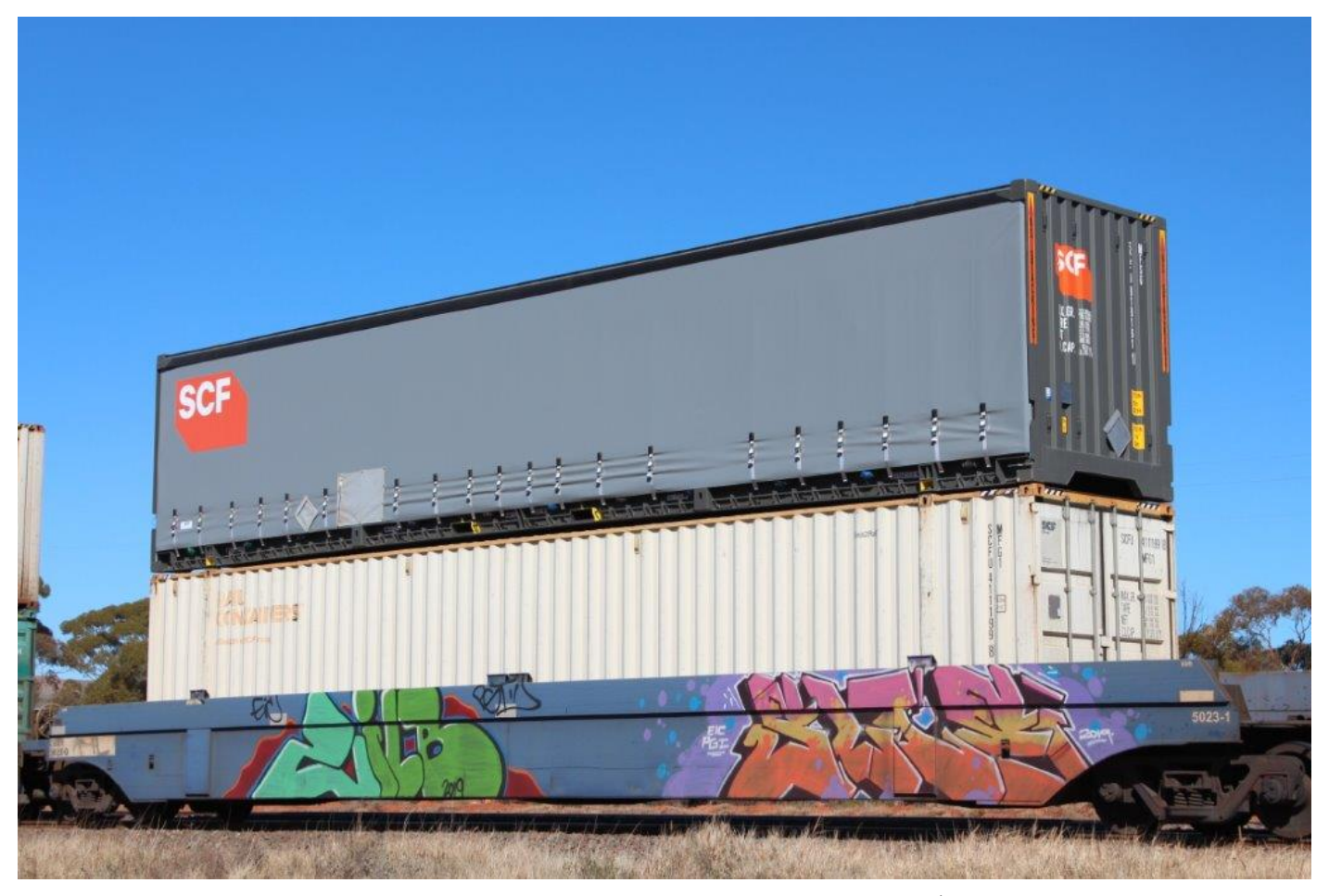
SCF have bought a batch of 48' curtainsiders recently. SCFU818161 at Parkeston, 3<sup>rd</sup> June.