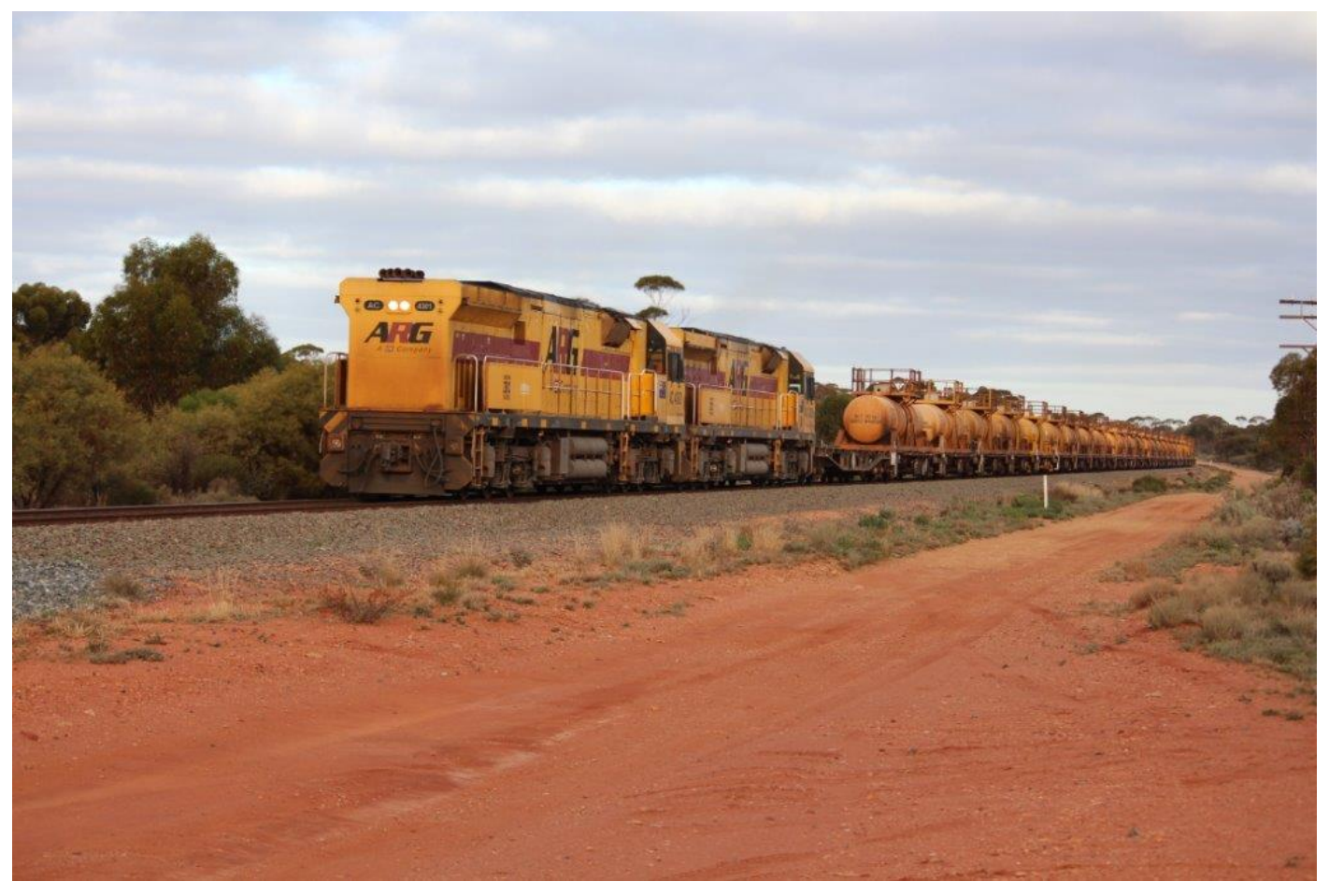
ACs 4301 & 4306 approach Binduli with 4410 loaded acid ex Hampton, 17^{th} June. Page 20 of 27