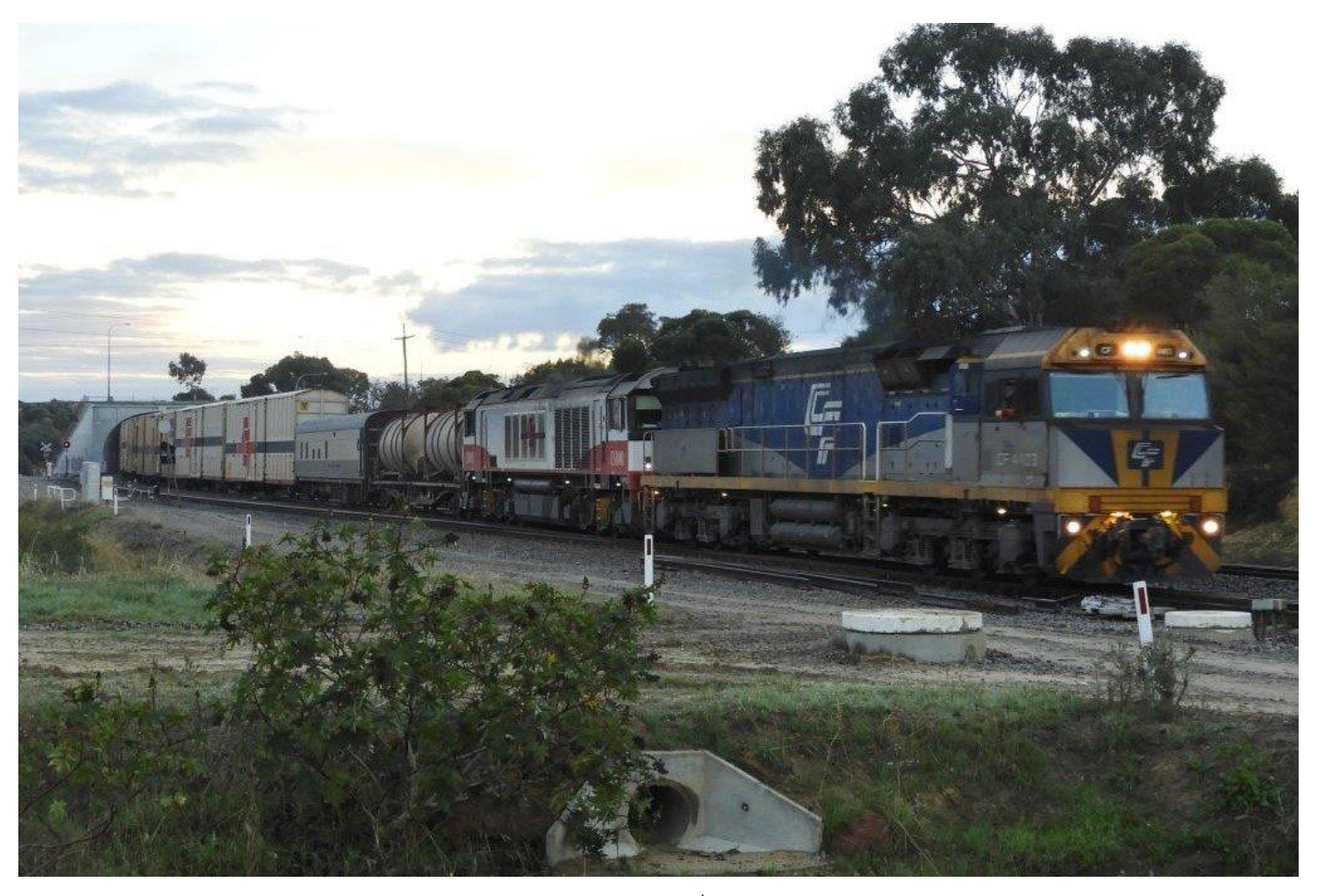
CF4403 & CSR001 enter Forrestfield with a very late 5MP9, 16<sup>th</sup> June.