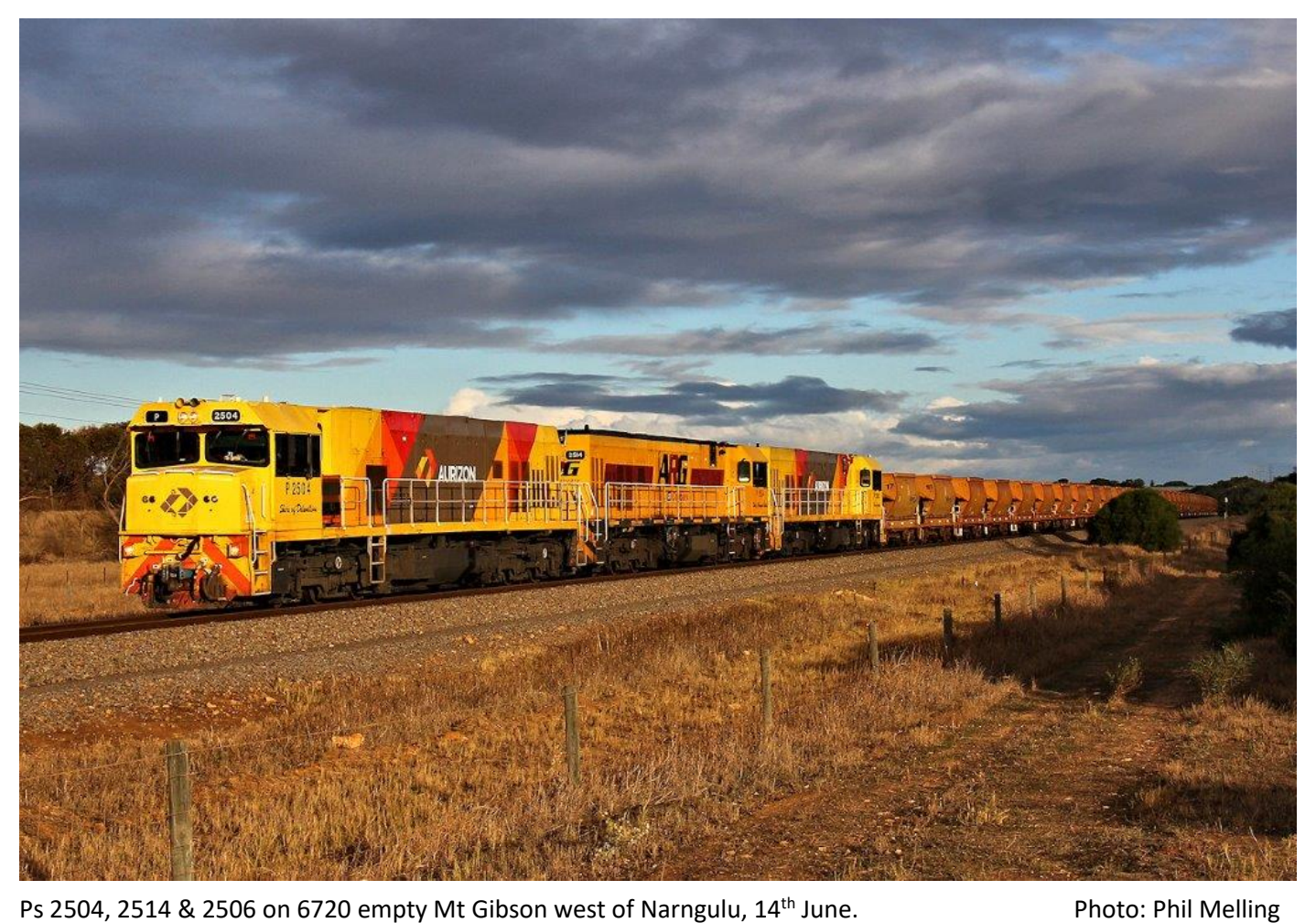
Ps 2504, 2514 & 2506 on 6720 empty Mt Gibson west of Narngulu, 14<sup>th</sup> June.