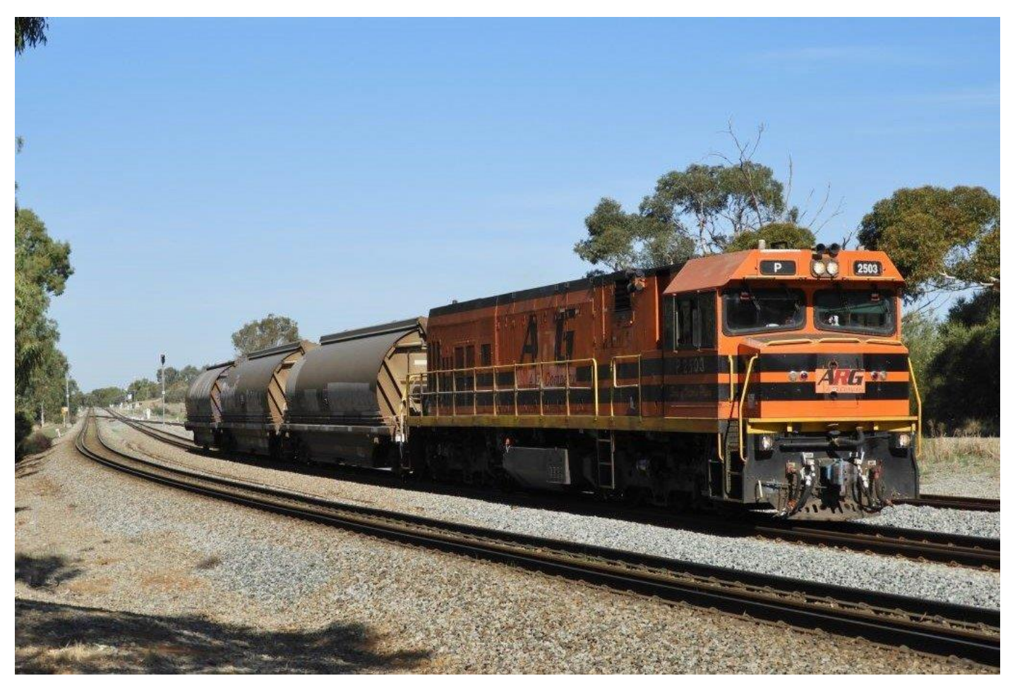
P2503 transfers three XY grain hoppers from Forrestfield to Narngulu as 7755, 1st June.