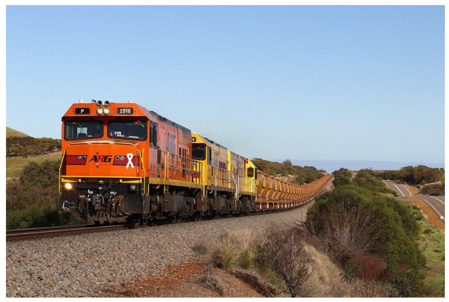
Ps 2516, 2514 & 2505 roll through Bringo on 7720 empty Mt Gibson ore, 29^{th} June.