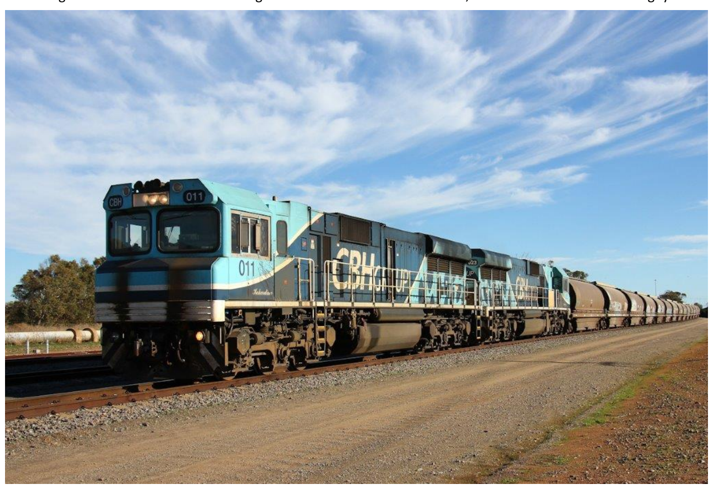
CBHs 011 & 023 arriving into Aurizon's yard at Narngulu, 29^{\text{th}} June. Page 7 of 9