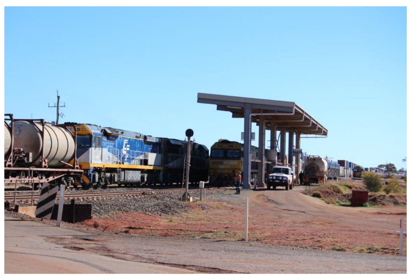
SCT013 & CF4410 (5MP9) cross NRs 77 & 60 (6PM6) and NRs 78 & 46, Parkeston, 22<sup>nd</sup> June.