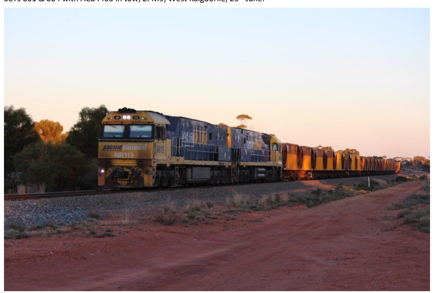
3034 ore approaches Binduli behind NRs 113 & 83, 25 ^{\rm th} June. Page {\bf 5} of {\bf 9}