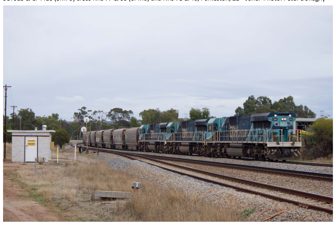
CBHs 015, 010 & 025 on 7K63 at East Northam, 22^{nd} June.