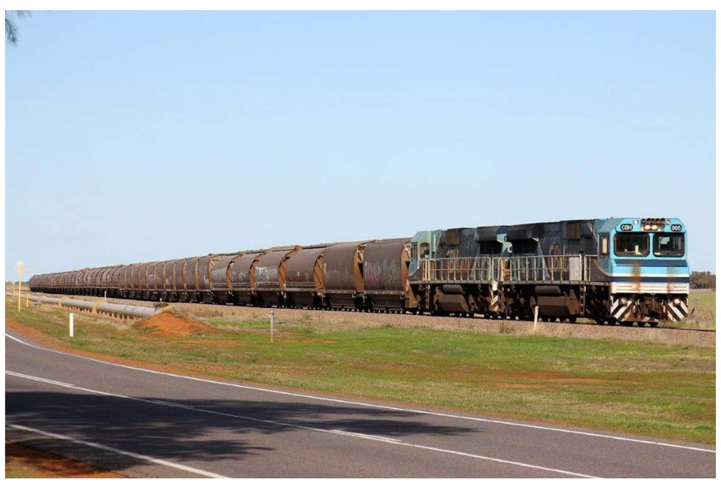
CBHs 005 & 024 lead a loaded grain through Georgina on a beautiful winter's day, 29^{\text{th}} June.