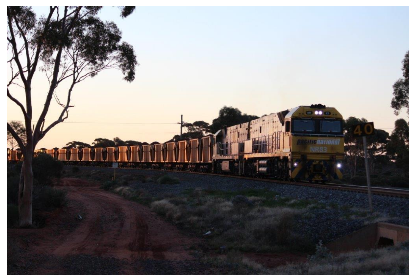
2035 ore arrives into Binduli at sunset behind NRs 83 & 113, 24<sup>th</sup> June.