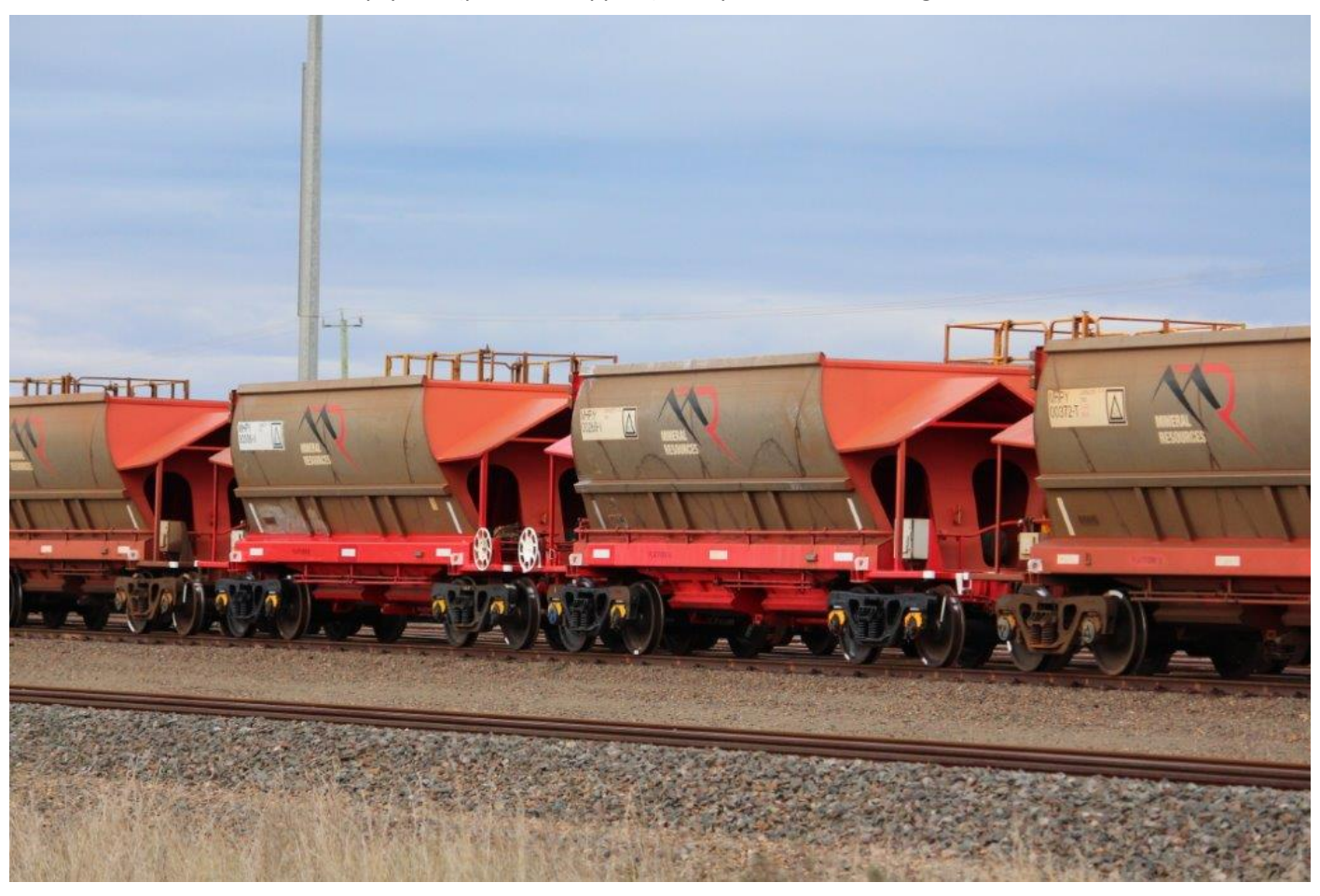
A pair of repaired MHPY hoppers, damaged in a derailment a year earlier, 26<sup>th</sup> June.