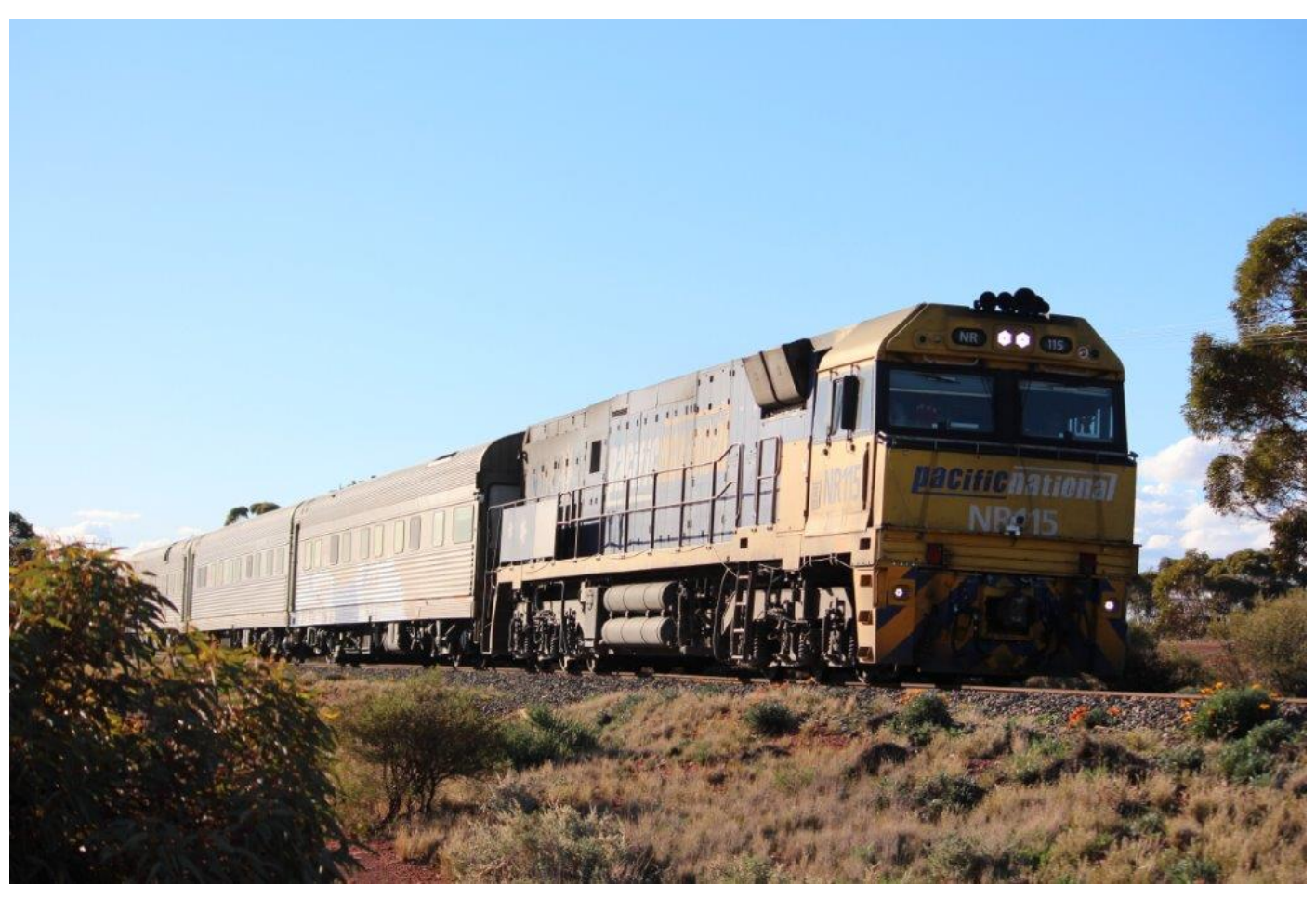
NR115 leads 7AK2 into Kalgoorlie after an inspection of the Leonora line, 22<sup>nd</sup> June.