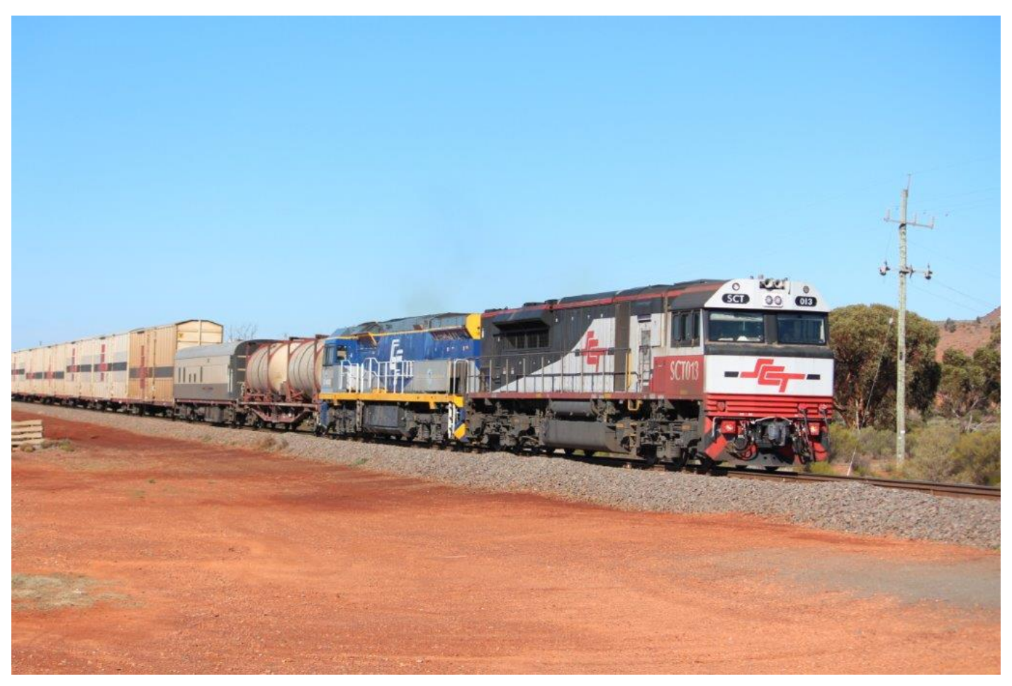
SCT013 and leased CF4410 approach Parkeston on 5MP9, 22<sup>nd</sup> June.

NUMBER 6_2 A free monthly photo e-Mag of railway happenings in WA during June 2019 PUBLISHER Peter Donaghy Email: <a href="mailto:peterdonaghy2@bigpond.com">peterdonaghy2@bigpond.com</a> Copyright: Peter Donaghy © 2019