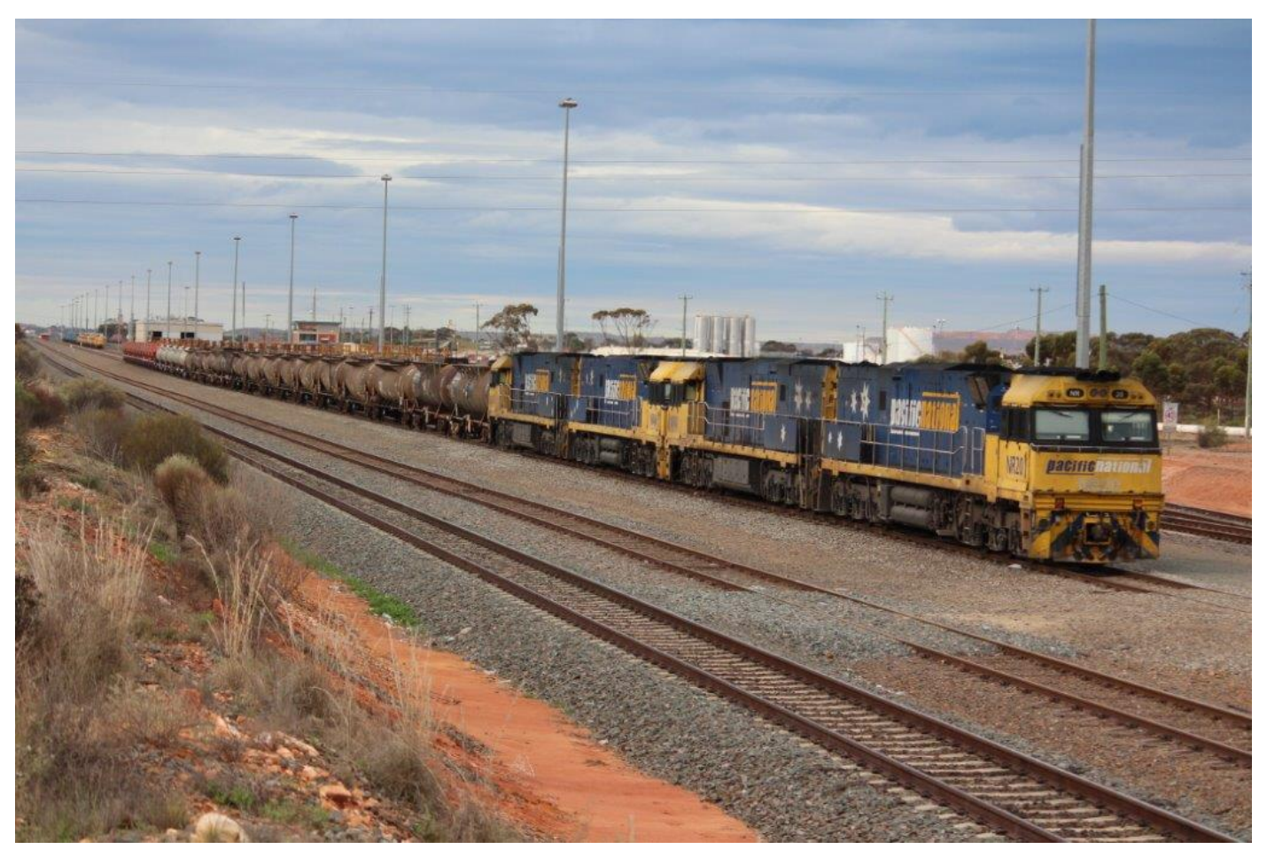
NRs 20, 40, 78 & 46 on 4445 empty fuel (plus ore hoppers) to Esperance, West Kalgoorlie, 26<sup>th</sup> June.