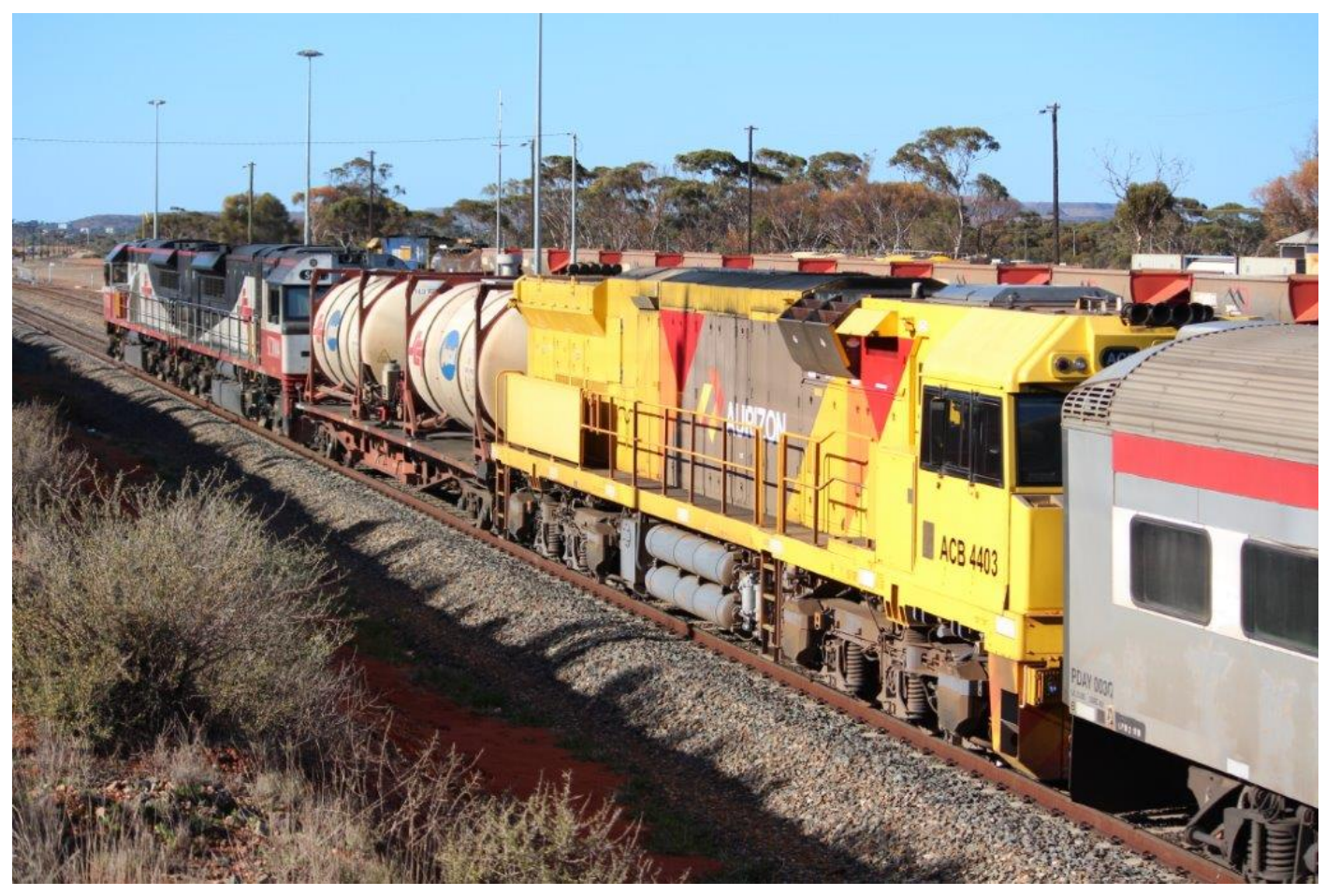
ACB4403 being hauled east on 2PM9 by SCTs 001 & 004, West Kalgoorlie, 25^{th}\, June.