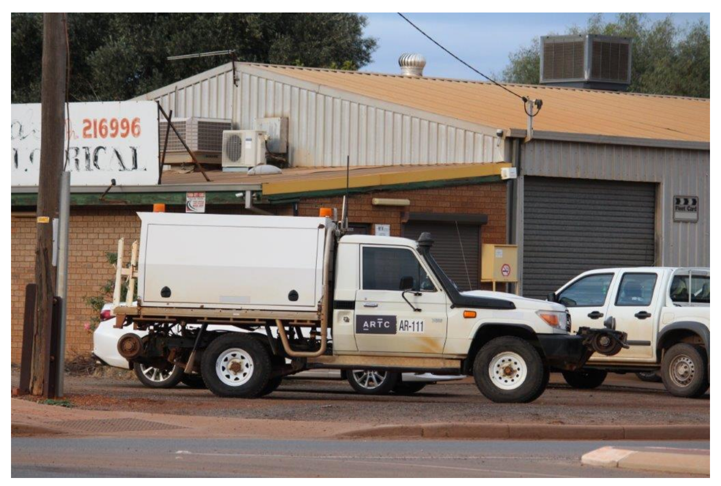
ARTC length runner's hirail AR111 awaiting attention from an autoelectrician, 26<sup>th</sup> June.