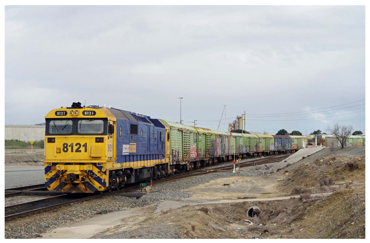
8121 works 7P51 Sadleirs shunt, Kewdale, 29<sup>th</sup> June.