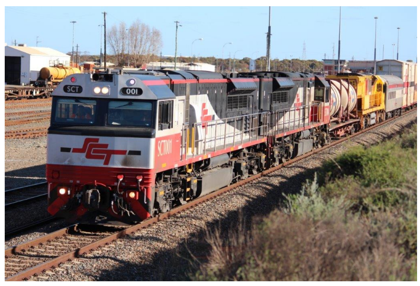
SCTs 001 & 004 with ACB4403 in tow, 2PM9, West Kalgoorlie, 25^{\rm th} June.