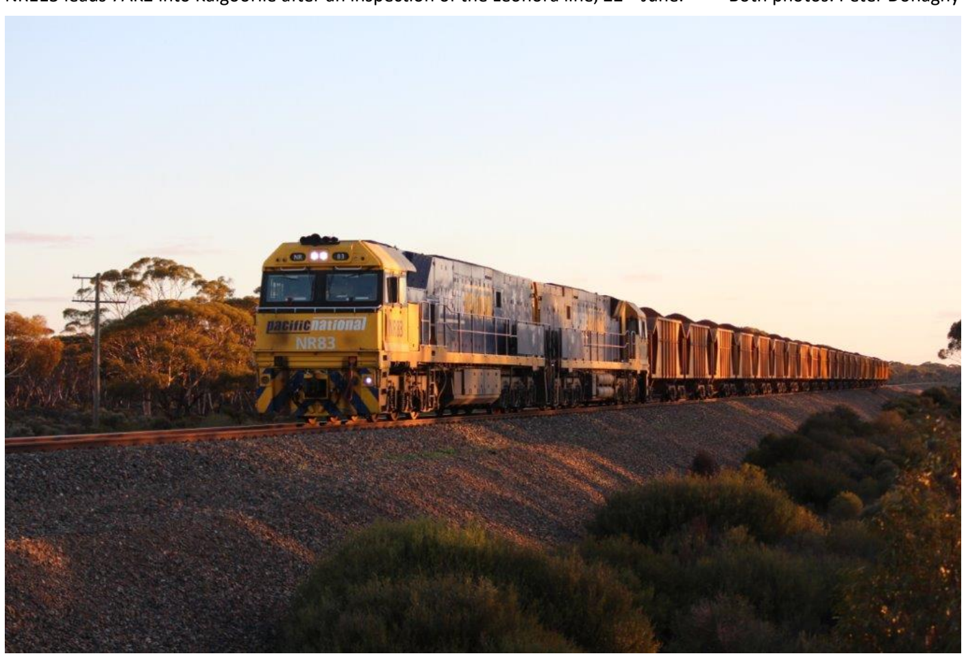
"Junior" returns! NRs 83 & 113 lead 22 CHEY hoppers as 2035 ore between Bonnie Vale and Kalgoorlie, 24<sup>th</sup> June. Page 3 of 9