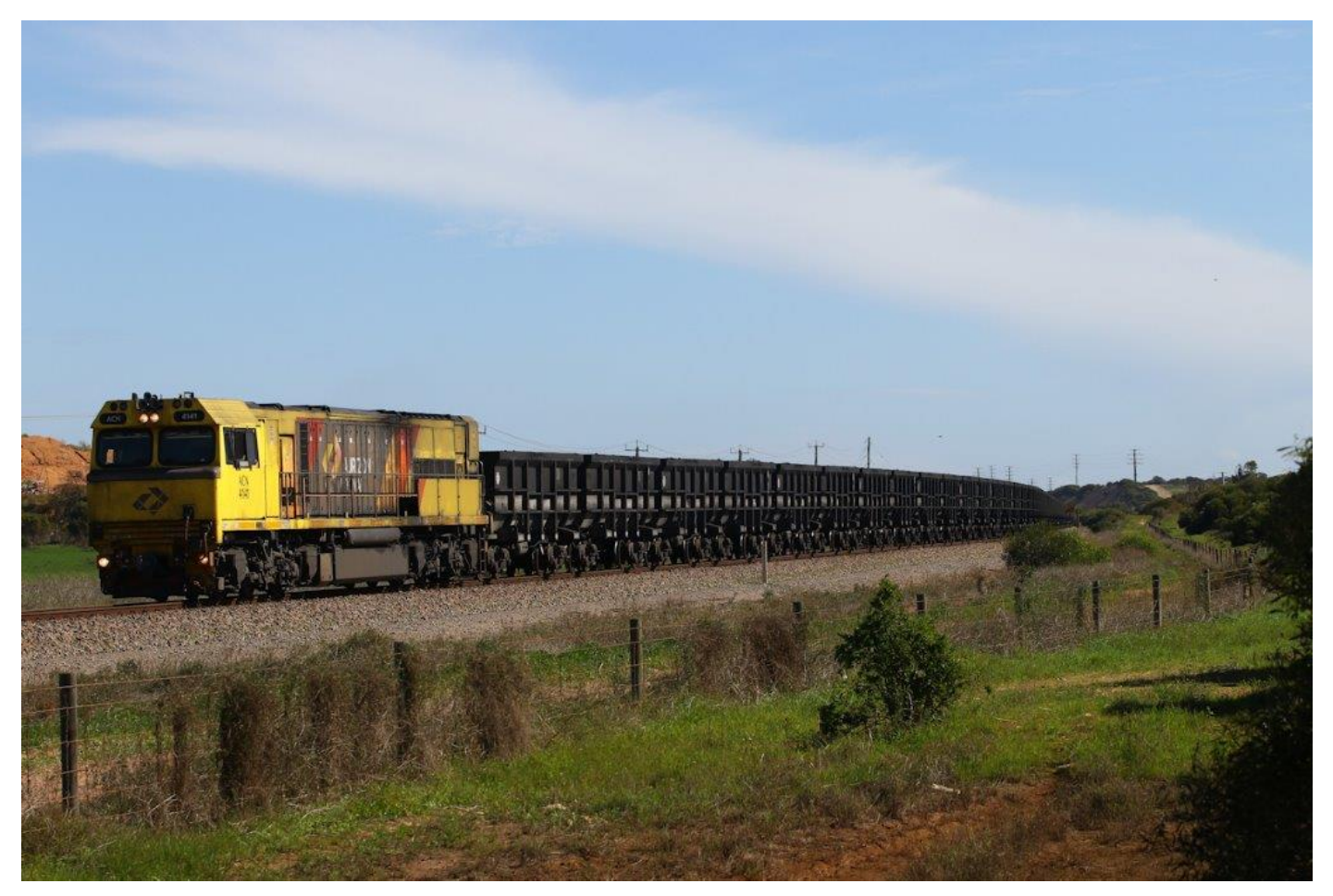
ACN4141 leads 7764 empty Karara ore into Narngulu, 27<sup>th</sup> July.