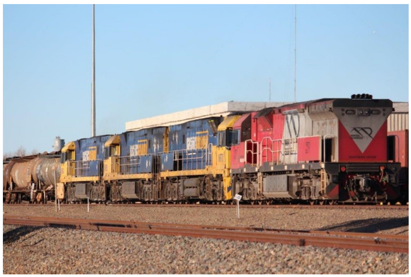
MRL003 shunts NRs 70, 39 & 24 and fuel tanks in West Kalgoorlie yard on 3<sup>rd</sup> July. The three NRs would then run 4445 empty fuel to Esperance, NR24 being transferred for ore traffic (see page 8). MRL003, which had been brought in that morning by NRs 70 & 39 on 3446 fuel, was transferred to Perth that night on 2MP5 for servicing.