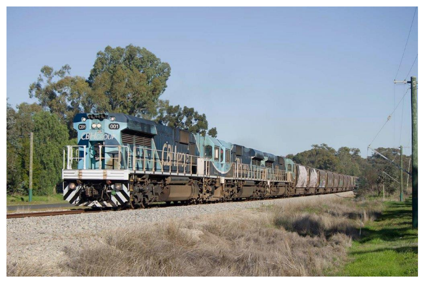
CBHs 001, 023 & 024 on 1GZ3 at Millendon, 14<sup>th</sup> July.