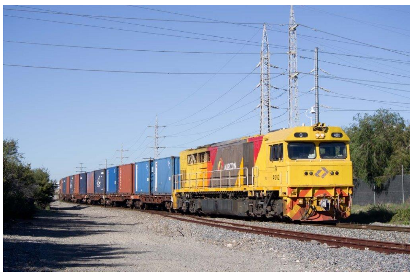
Q4002 runs 3196 container shuttle, Robb Jetty, 16<sup>th</sup> July.