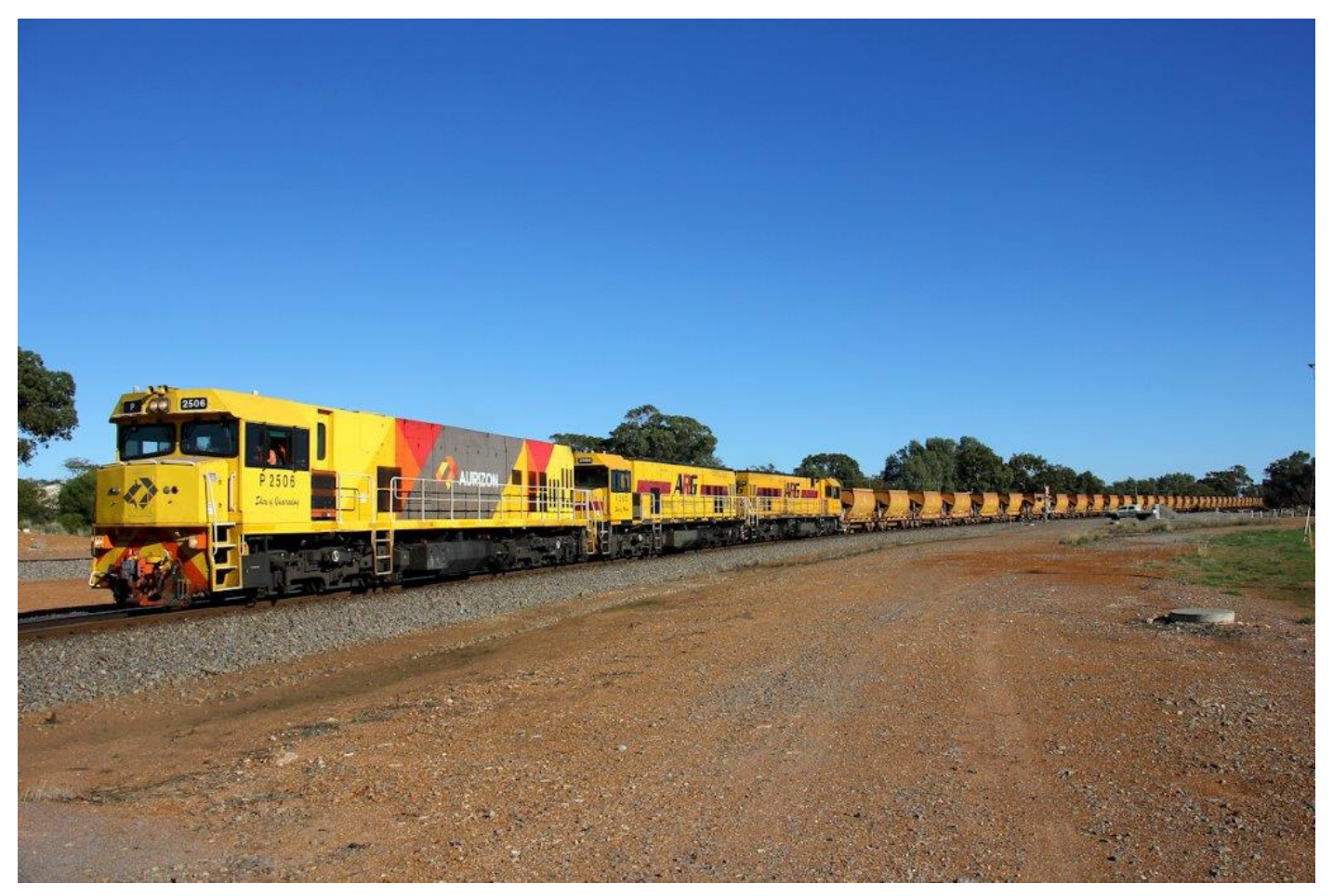
Ps 2506, 2502 & 2514 depart Narngulu (above) and climb through Bringo (below) with 7720 empty Mt Gibson ore, 13<sup>th</sup> July.