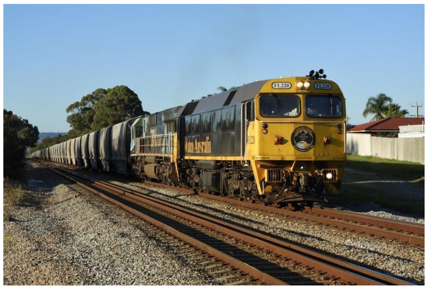
FL220 & CBH118 work 2S56 ex Metro Grain Centre to CBH Kwinana through Thornlie, 15th July.