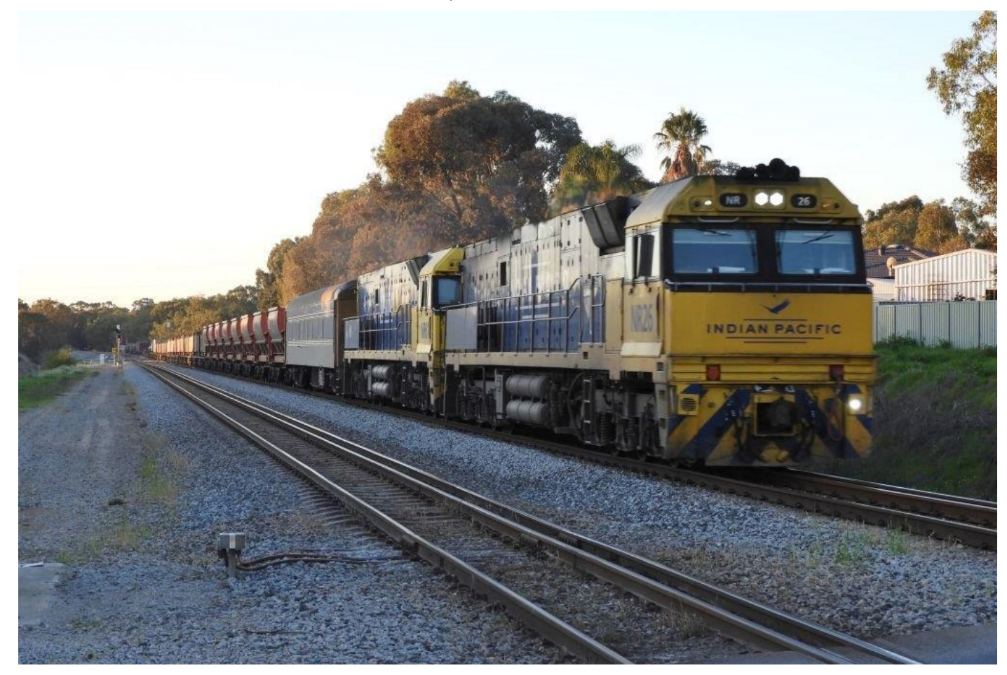
NRs 26 & 61 with eight MHPY hoppers ex Esperance on 5MP2, 14<sup>th</sup> July.