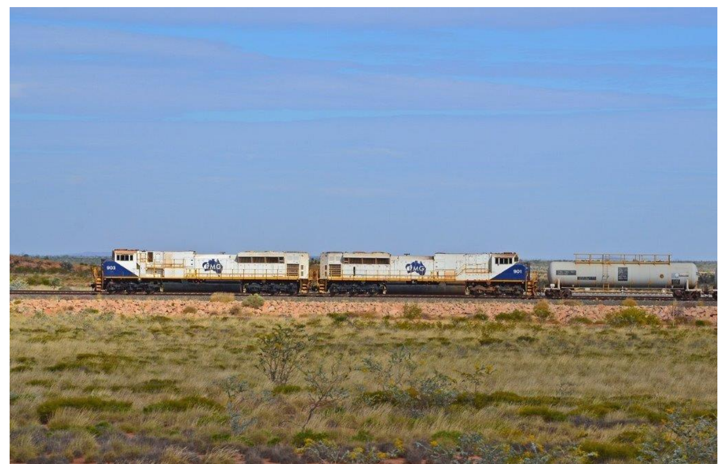
903 & 901 on the FMG fuel train at Chapman, 28^{th} July.