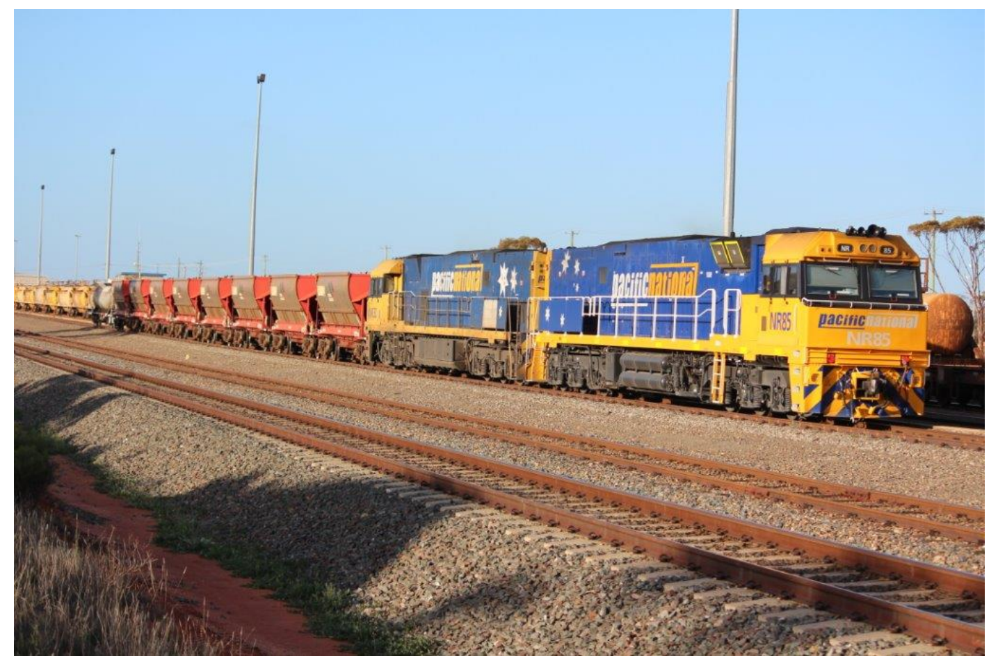
NRs 85 & 32 wait for the rest of the loading to be attached for 2445 to Esperance, 22<sup>nd</sup> July. Page 21 of 28