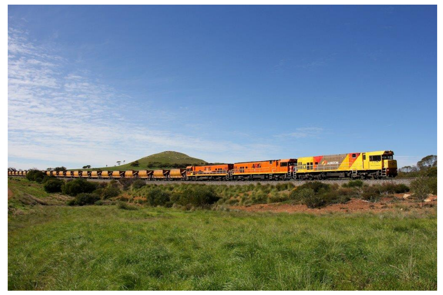
Ps 2504, 2509 & 2516 on 7721 loaded Mt Gibson ore at Old Grants, 27<sup>th</sup> July.