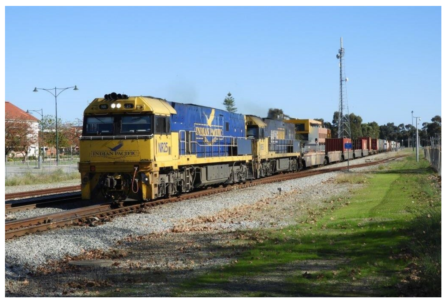
1PS6 passes through Midland behind NRs 25 & 53, 14^{th} July.