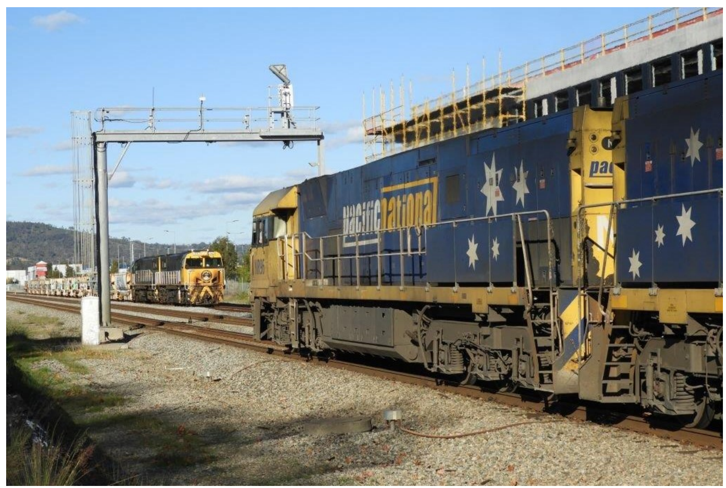
NRs 96 & 89 on 1PM5 cross the DRs at Midland, 7<sup>th</sup> July. Page 9 of 28