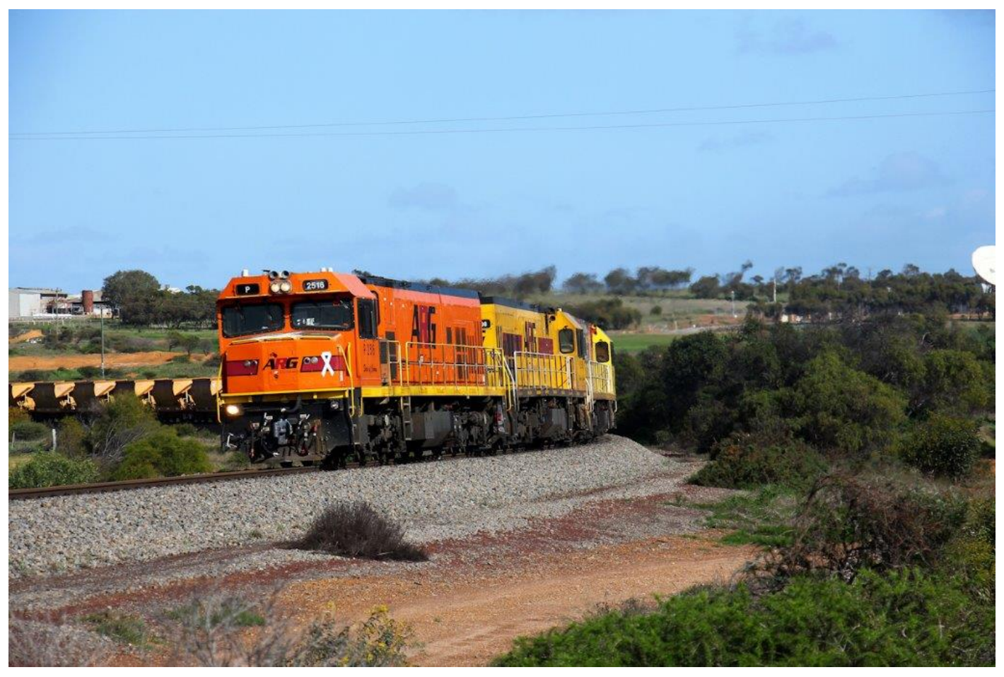
7720 empty Mt Gibson ore climbs through Moonyoonooka behind Ps 2516, 2508 & 2505, 20/7.