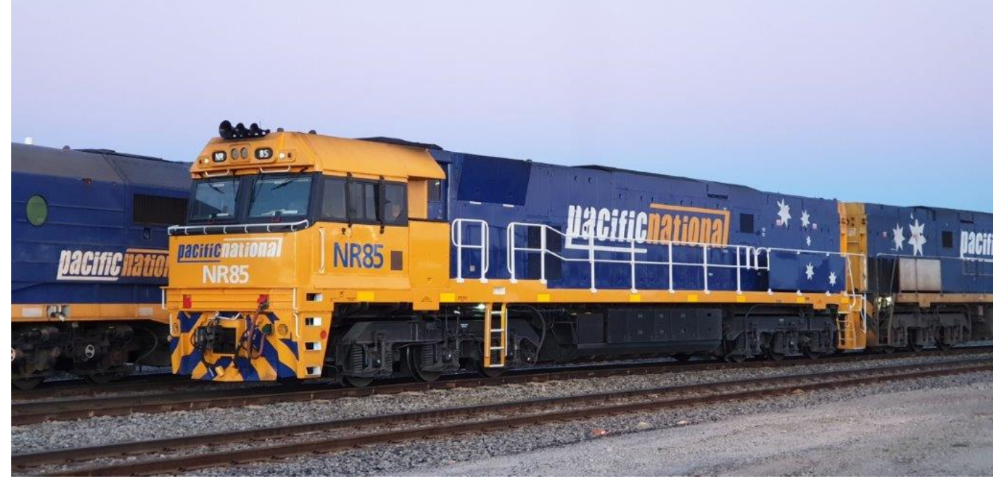
Former Southern Spirit NR85 displays its new coat at Perth Freight Terminal, Kewdale, 16<sup>th</sup> July.