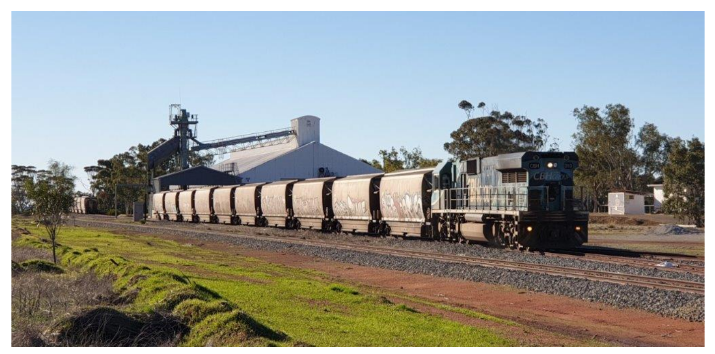
CBH010 shunts 4K14 grain at Bindi Bindi, 3<sup>rd</sup> July.