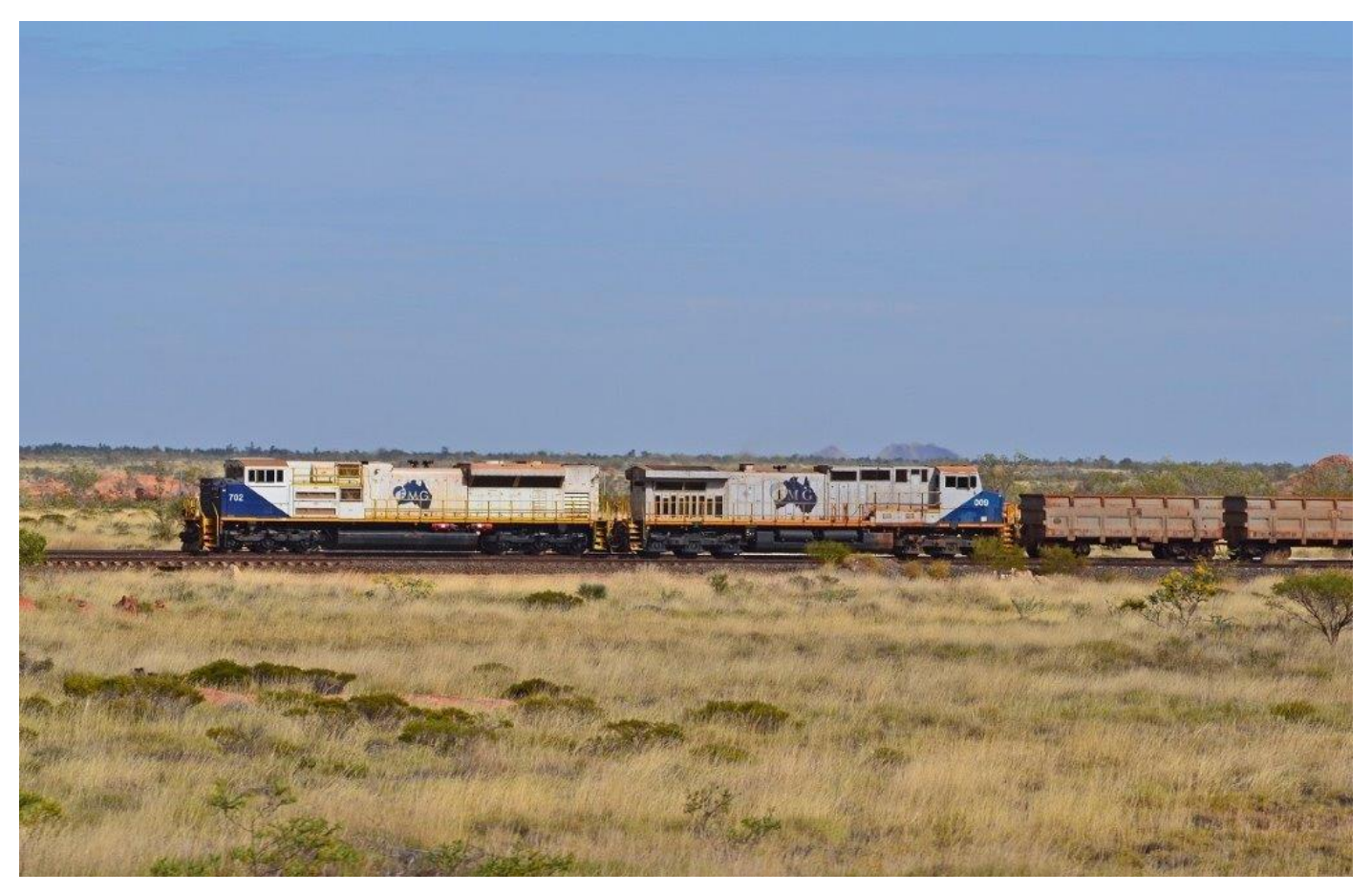
An FMG empty rake at Chapman, led by 702 & 009, 28<sup>th</sup> July.