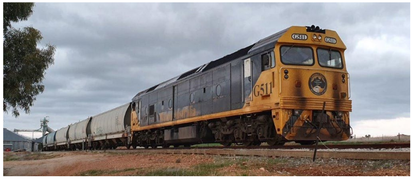
G511 with a rake of NGXH grain hoppers (now returned to NSW) at Grass Valley, 23<sup>rd</sup> July.