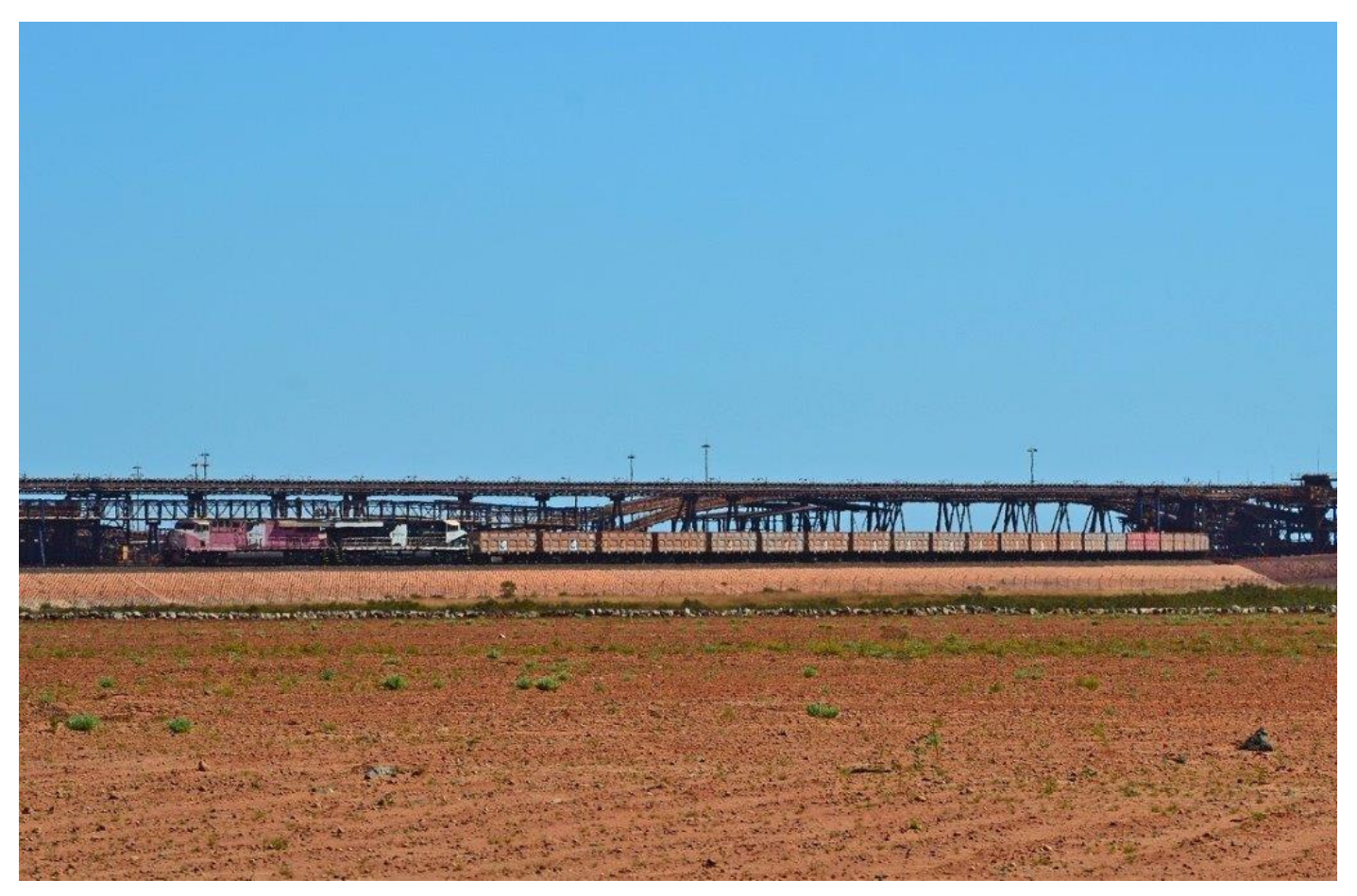
RHAs 1023 & 1001 unloading at Roy Hill's port terminal, 27<sup>th</sup> July.