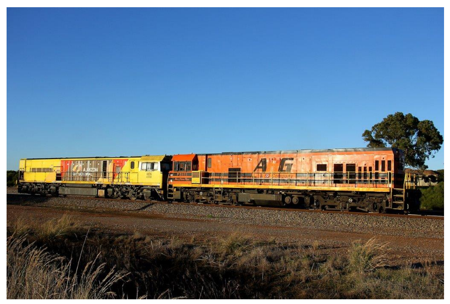
P2503 leads ACN4150 light engine at Narngulu, 15<sup>th</sup> July.