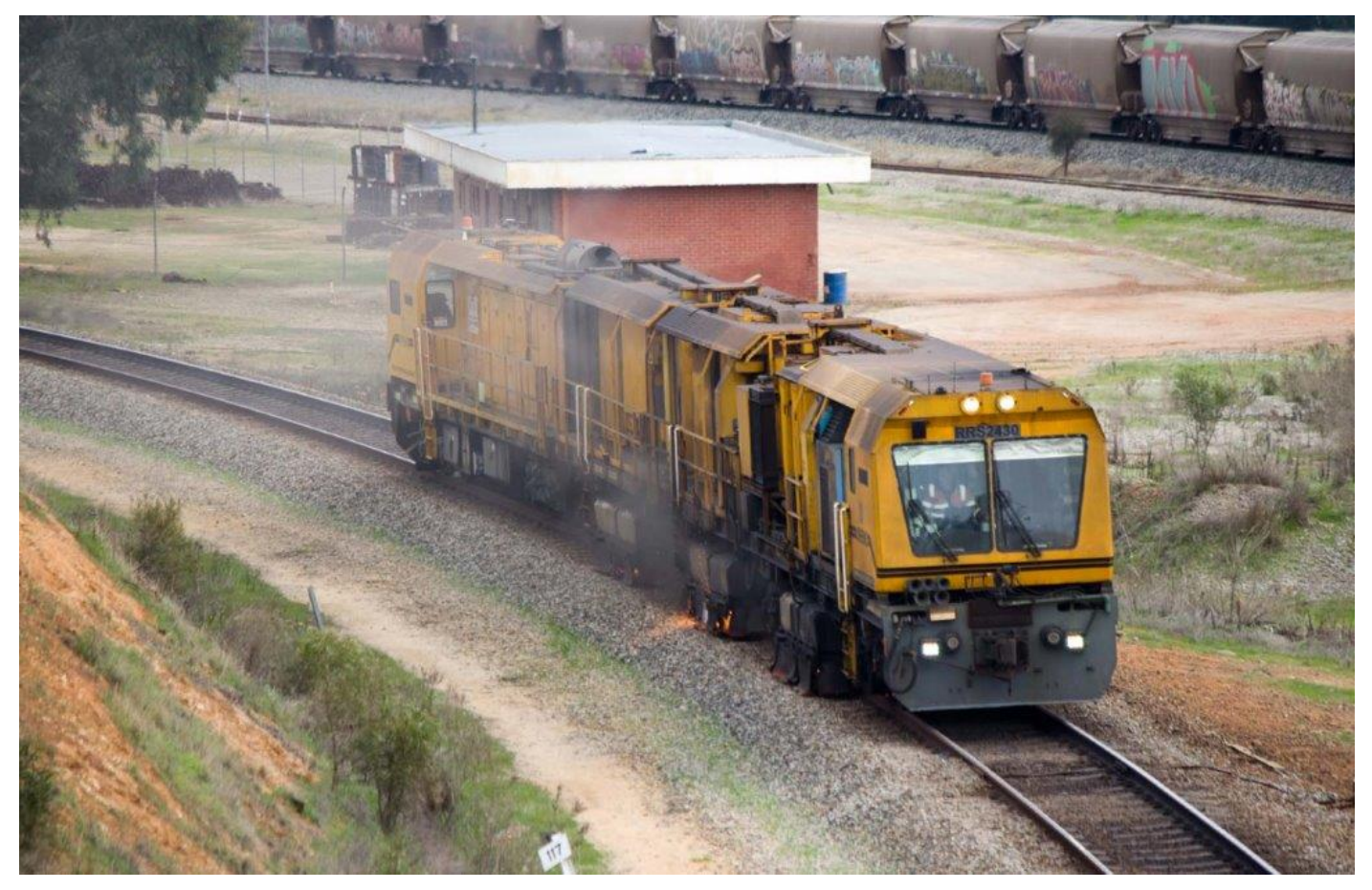
Speno rail grinder RRS2430 at work reprofiling the rail head, Avon Yard, 18^{th} July.