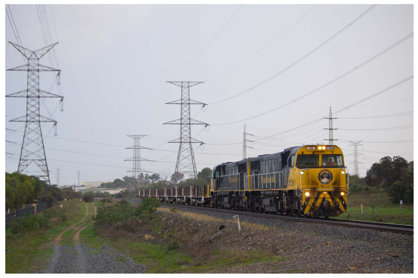
DRs 1565 & 1564 lead 6RT1 empty railset through Hope Valley, 5<sup>th</sup> July.