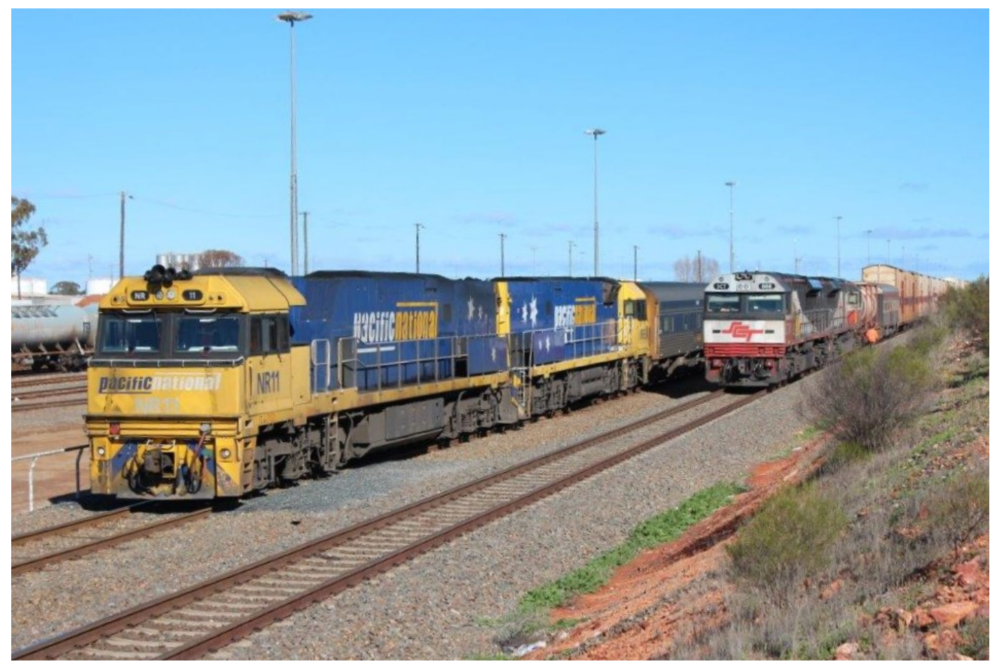
NRs 11 & 69 depart West Kal on 6PM7 while SCTs 008 & 009 wait on 6PM9, 6<sup>th</sup> July. Page 7 of 28