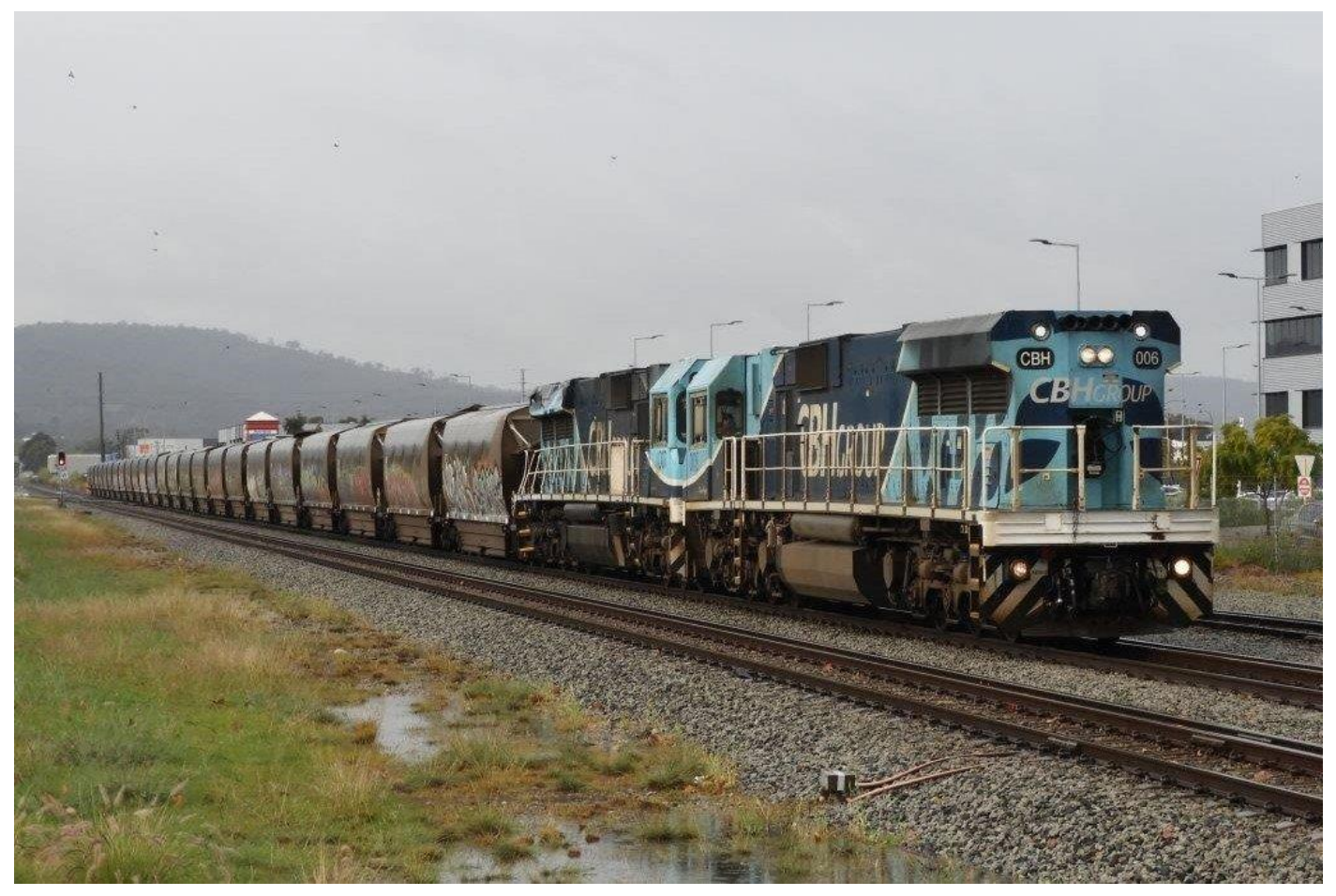
CBH006 hauls damaged CBH007 on 6K14, Midland, 5<sup>th</sup> July. CBH007 derailed at Miling in late June, and toppled over onto its side.