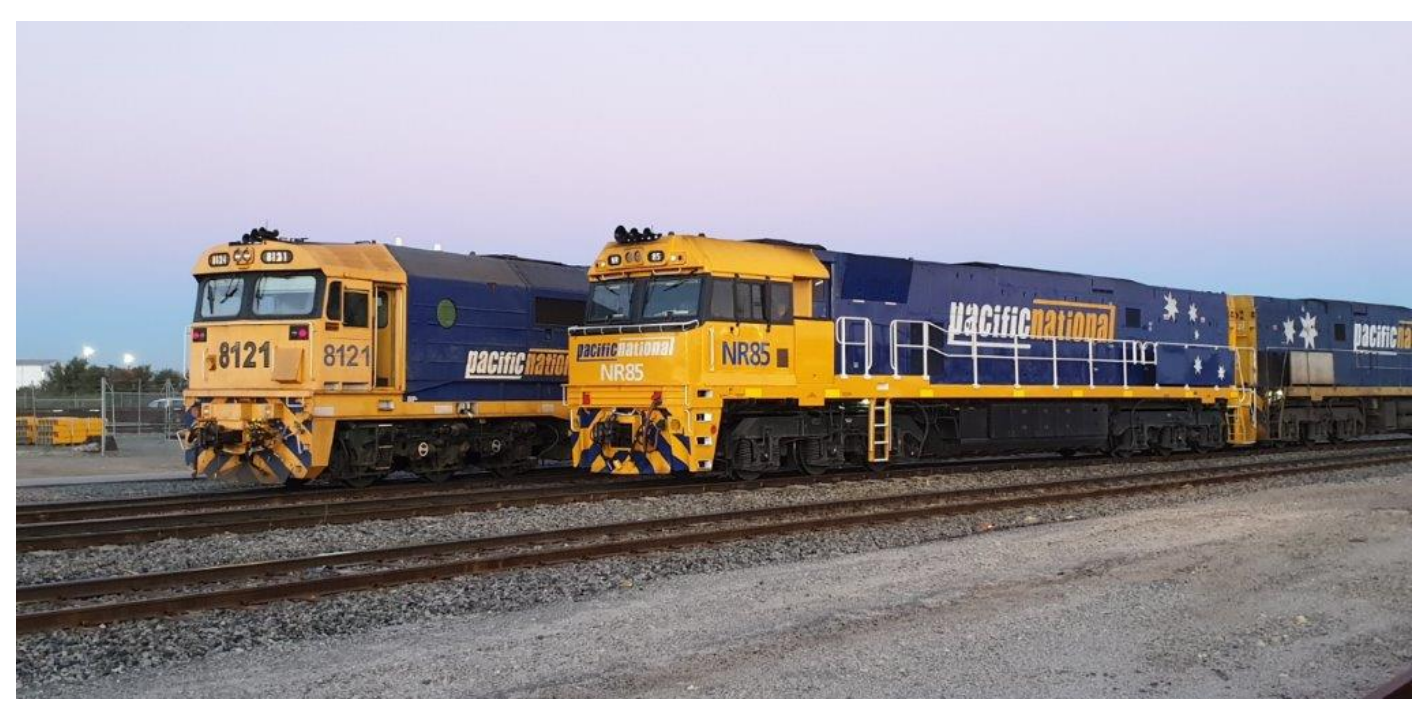
Terminal shunter 8121 stands beside NRs 85 & 32 in the Perth Freight Terminal, Kewdale, 16<sup>th</sup> July.