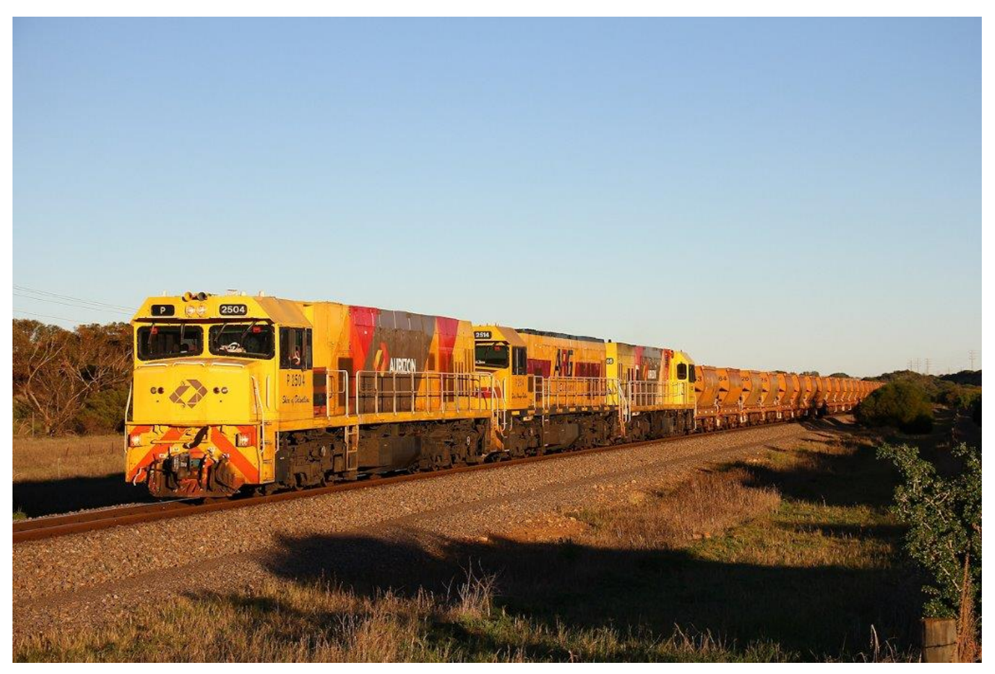
Ps 2504, 2514 & 2505 lead 4720 empty Mt Gibson ore at Narngulu West, 3<sup>rd</sup> July.