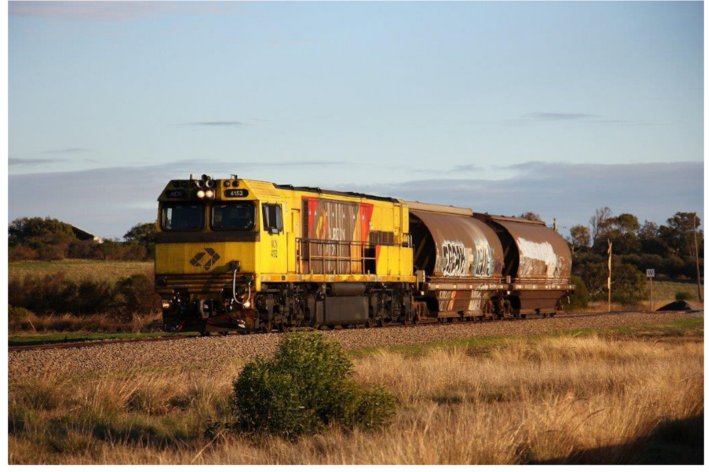
ACN4152 on 2754 wagon transfer, Bootenal, 1<sup>st</sup> July.

NUMBER 7 A free monthly photo e-Mag of railway happenings in WA during July 2019 PUBLISHER Peter Donaghy Email: <u>peterdonaghy2@bigpond.com</u> Copyright: Peter Donaghy© 2019