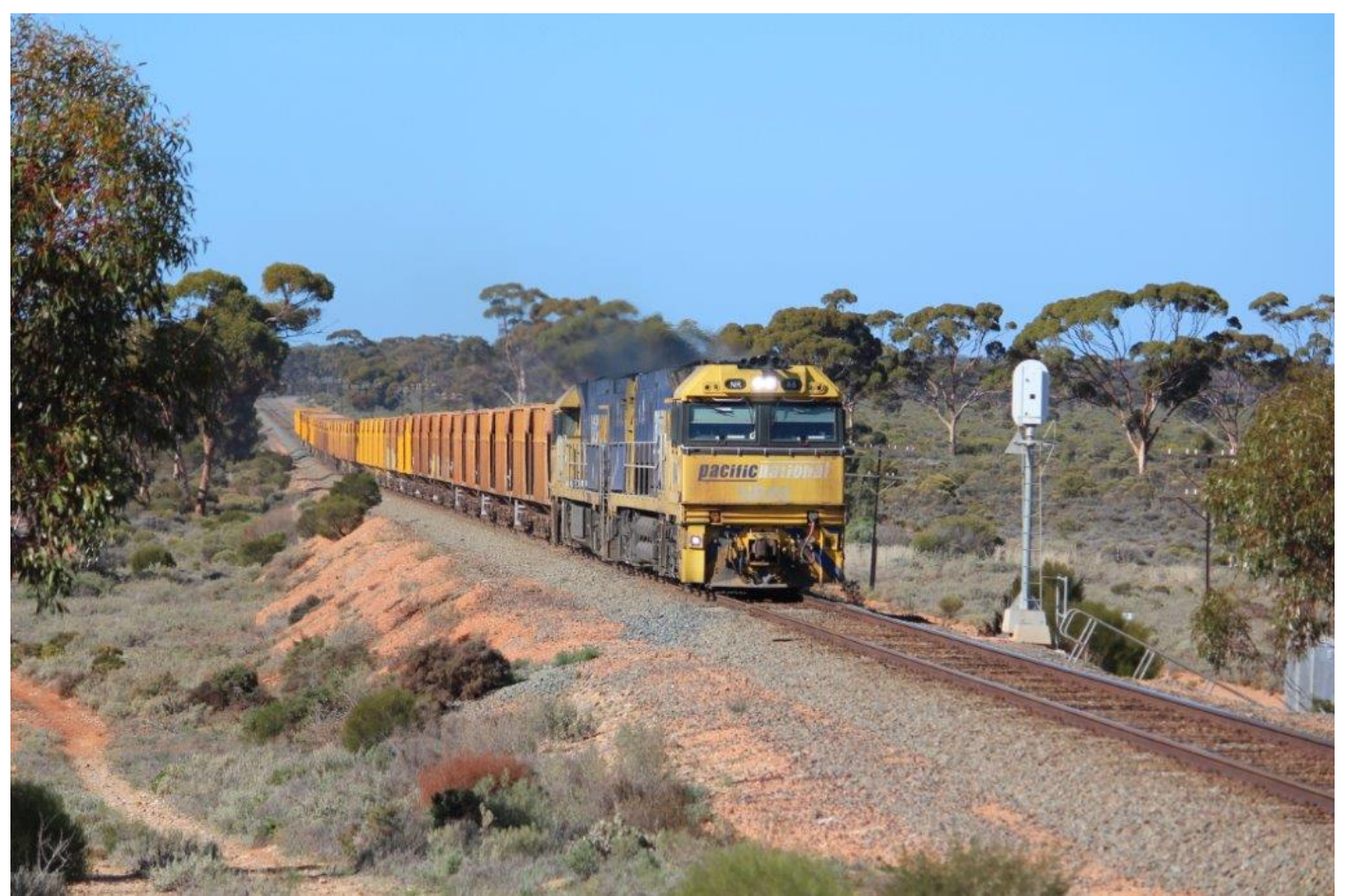
1030 empty ore passes the 7km peg on approach to Binduli behind NRs 46 & 113, 14<sup>th</sup> June. Page 12 of 28