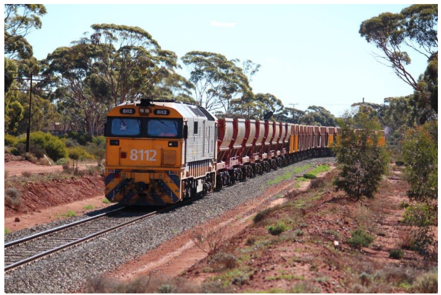
Its only working while in WA, 8112 hauls the hoppers ex 6PM7 into Binduli for the rear of 7030, 6<sup>th</sup> June. Page 8 of 28