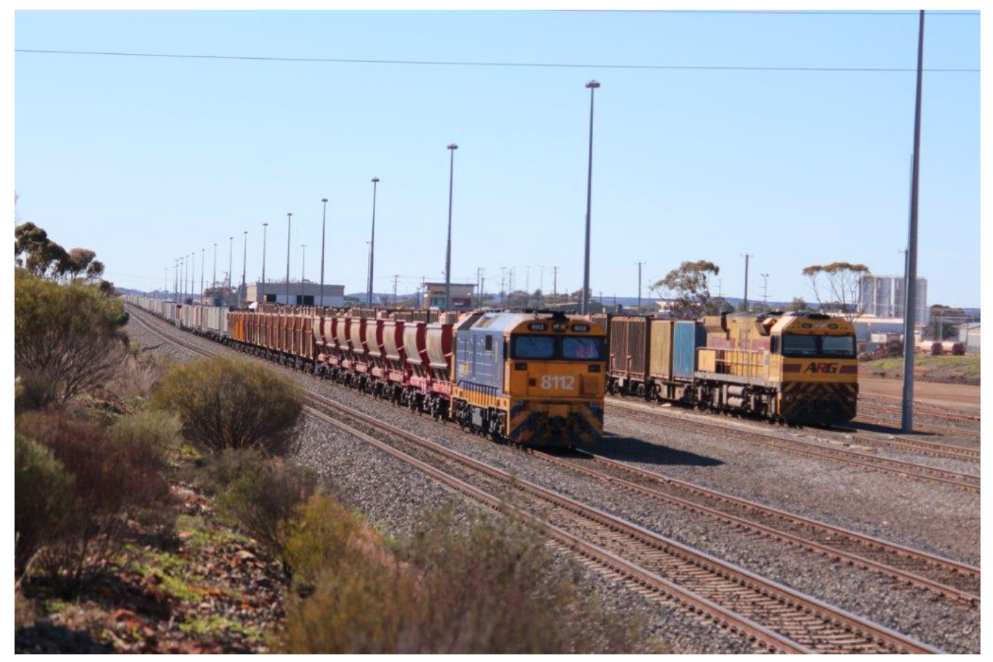
8112 removes ore hoppers from the rear of 6PM7, while AC4301 stands on stabled 6430 empty sulphur, 6<sup>th</sup> July. Page 6 of 28