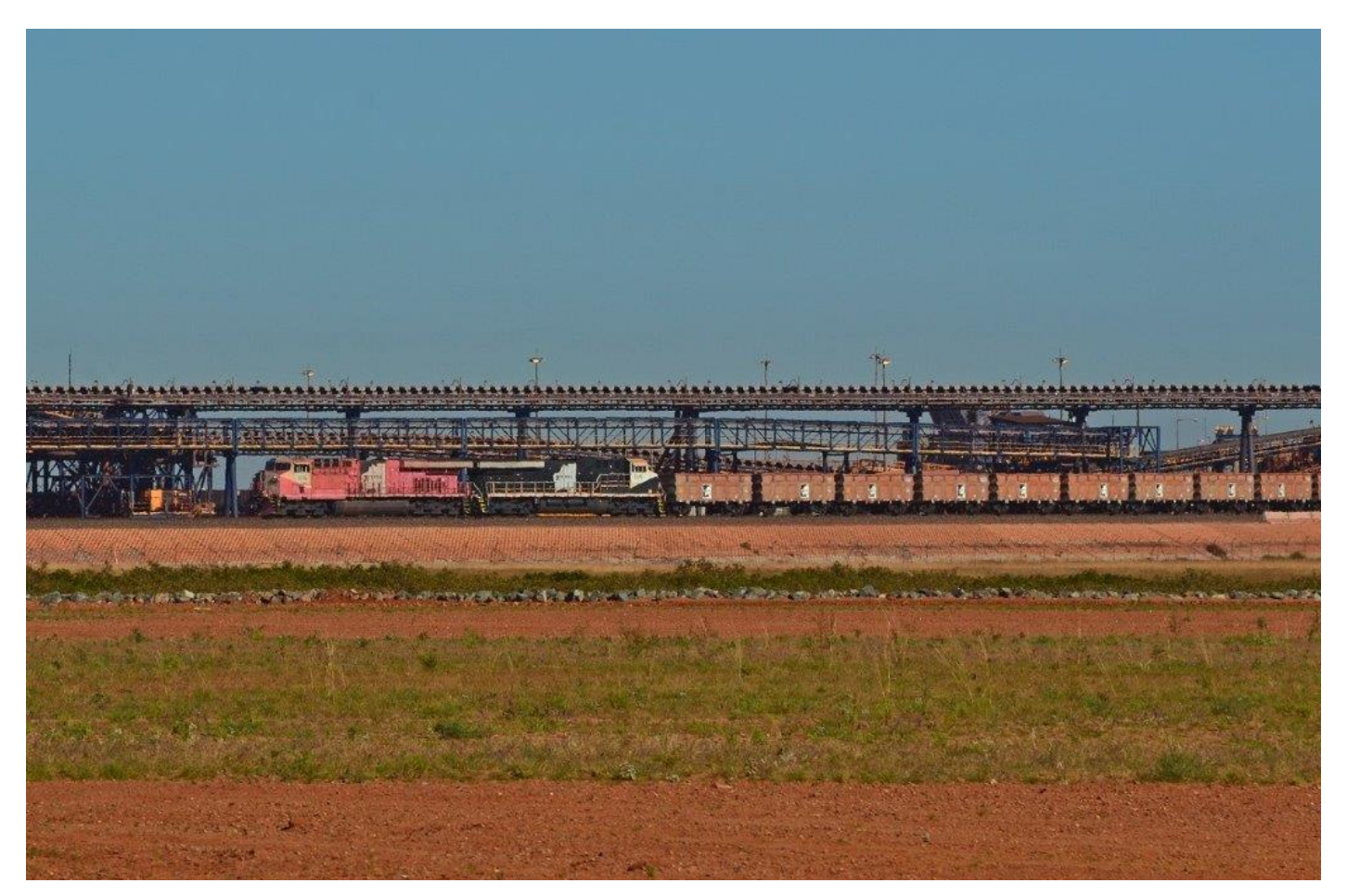
RHAs 1026 & 1019 tipping at Roy Hill's port facilities, 26<sup>th</sup> July.