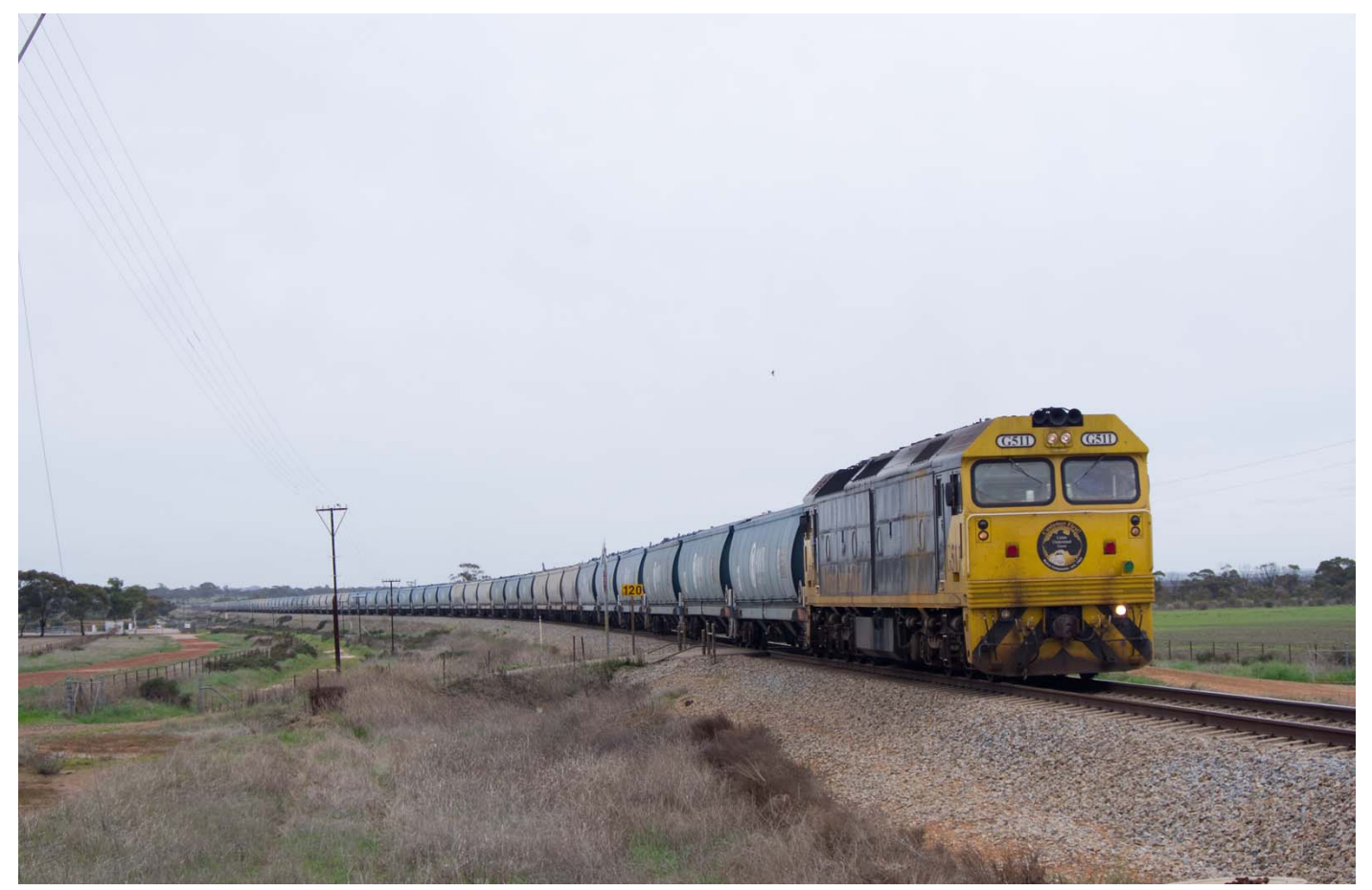
G511 hauls the NGXH rake as 6S51 through Cunderdin, 26<sup>th</sup> July. The hoppers were loaded at West Merredin and<br/>departed the next morning behind NRs 37, 10 & 47 as 7PG4 to NSW.Page 23 of 28