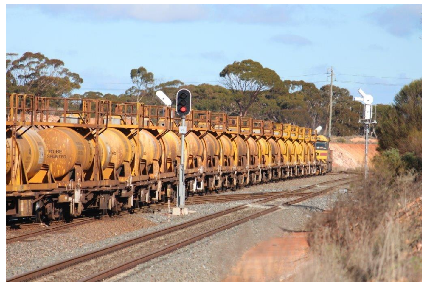
AC4307 departs West Kal with 7405 empty acid shuttle to Hampton, 6<sup>th</sup> July.