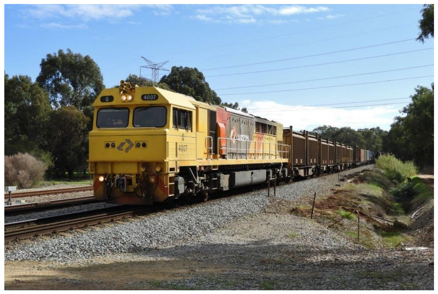
2430 empty sulphur ex Malcolm rolls through Woodbridge behind Q4007, 9<sup>th</sup> July.