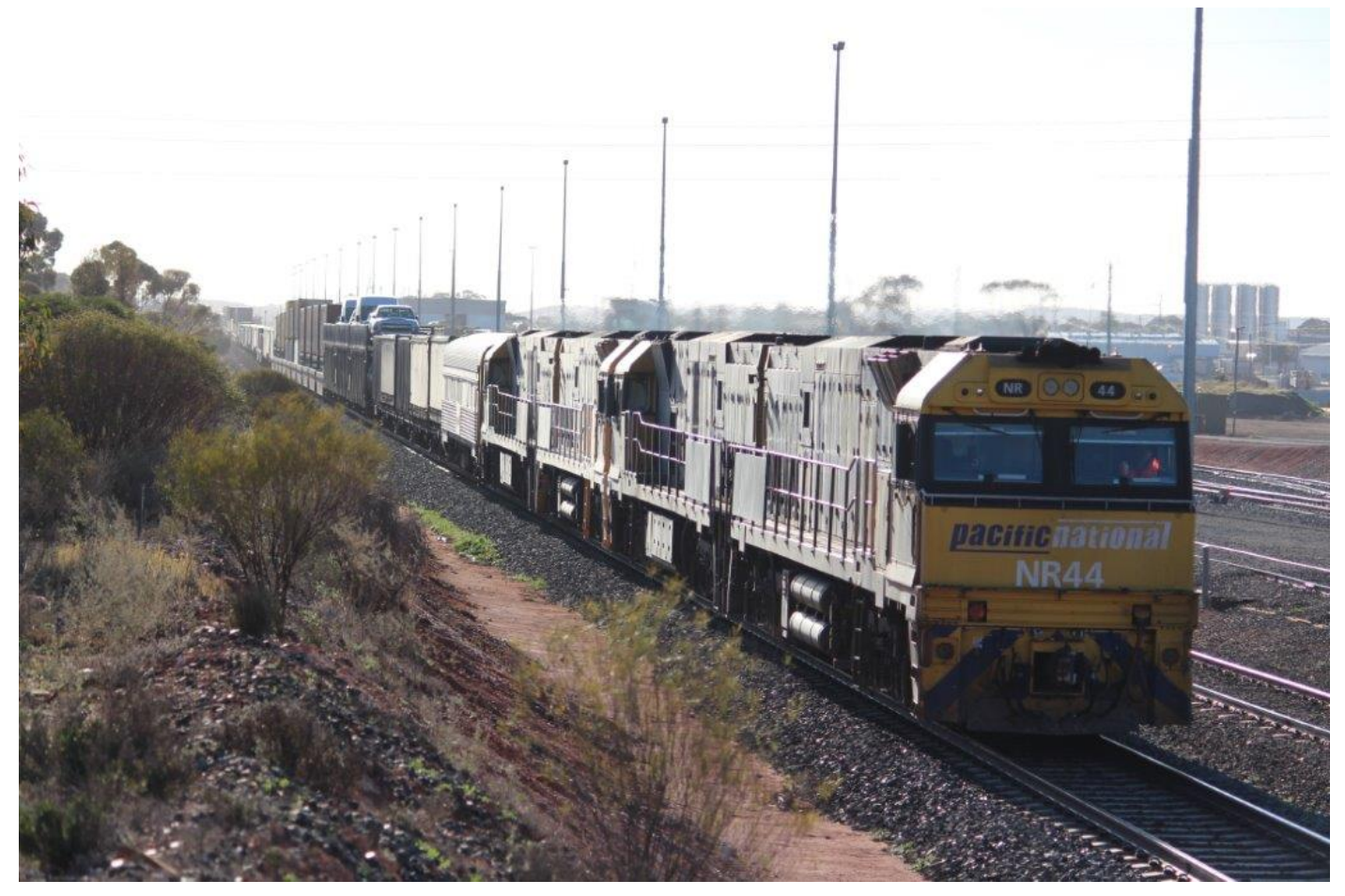
NRs 44, 96, 85 & 32 arrive at West Kalgoorlie on 6MP4, 21<sup>st</sup> July. The rear pair were removed for Esperance.