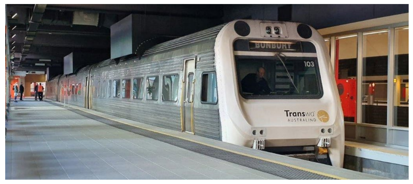
ADPs 103, 101 & 102 prepare to depart Perth station with 3209 to Bunbury, 23<sup>rd</sup> July.