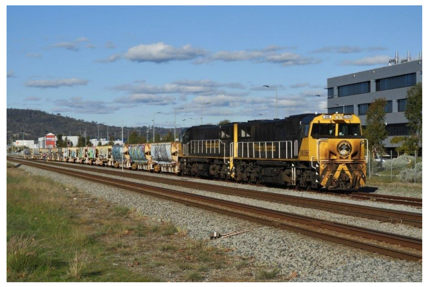
DRs 1565 & 1564 take the loop at Midland with 1BT2 empty ballast, 7<sup>th</sup> July.