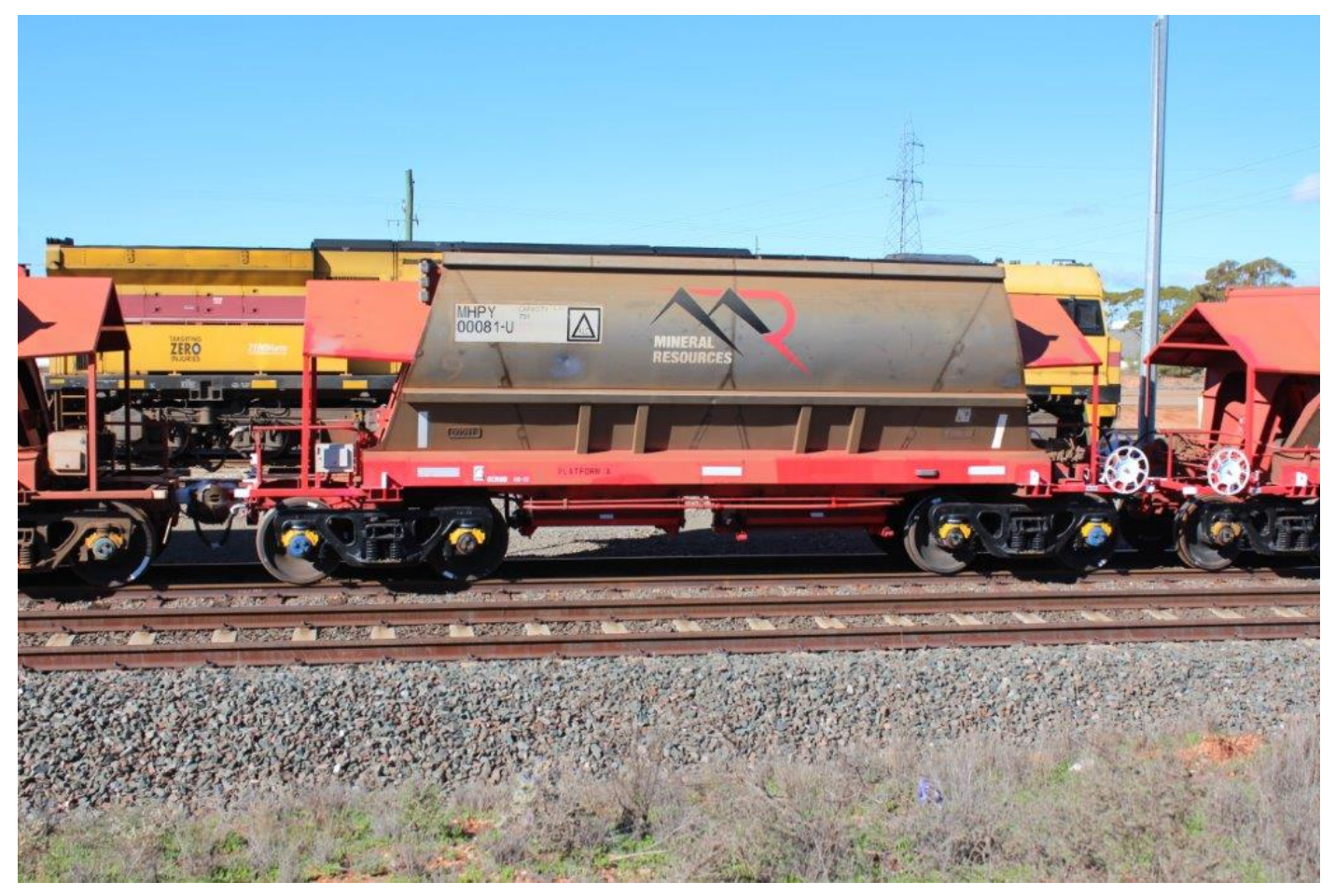
Repaired MHPY81 on 6PM7 at West Kal, 6<sup>th</sup> July – damaged in the Salmon Gums derailment eight months earlier.