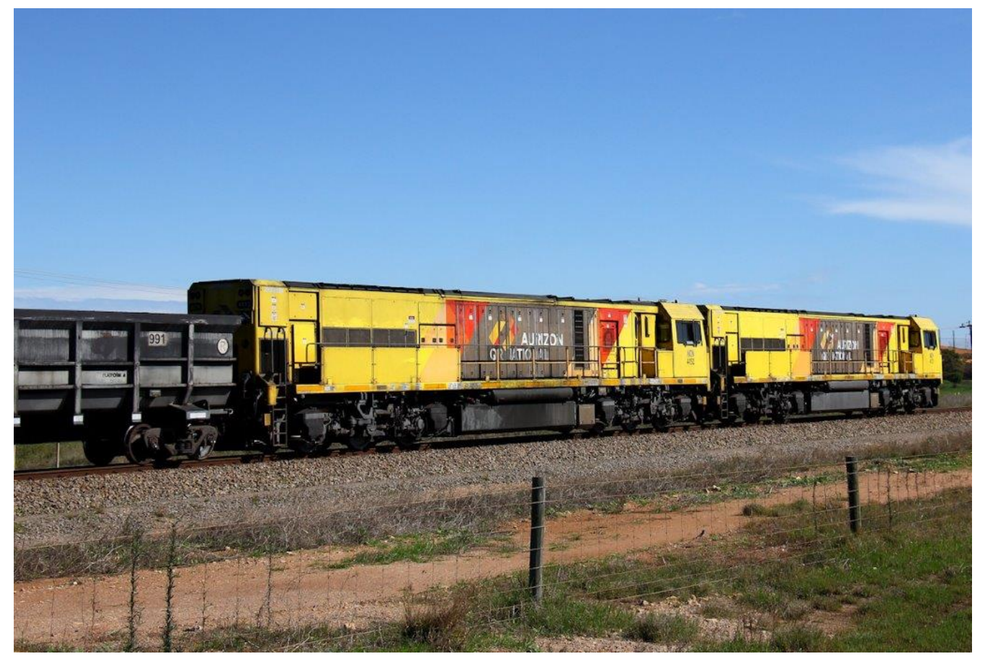
ACNs 4152 & 4171 are the DP units behind 7764 empty Karara ore, Narngulu, 27<sup>th</sup> July. Page 25 of 28