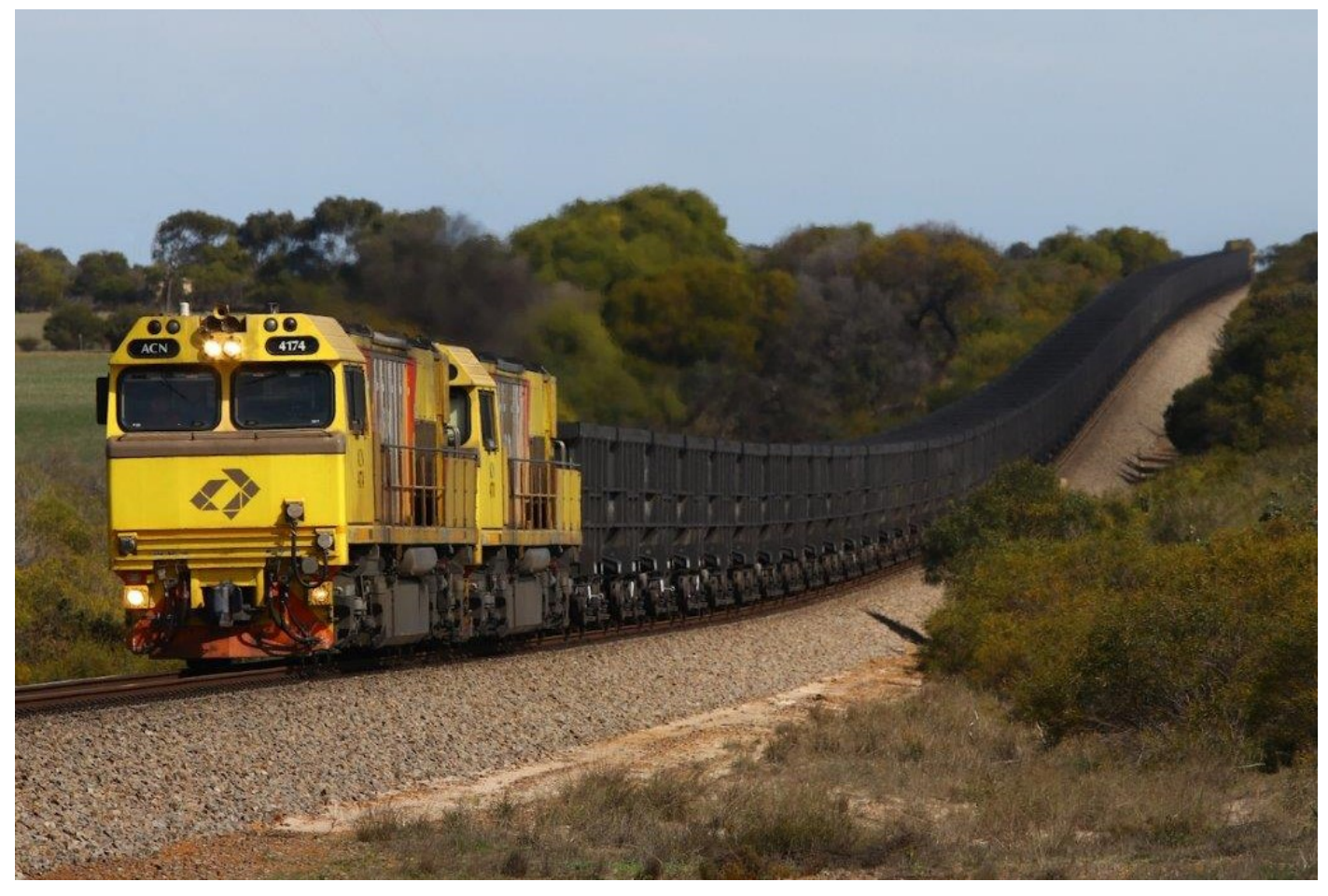
ACBs 4174 & 4170 with 4169 on the rear power 7762 empty Karara ore through Kojarena, 27<sup>th</sup> July.