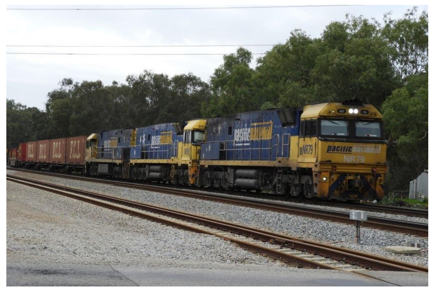
NRs 79, 59 & 35 lead 6SP5 through Woodbridge, 21<sup>st</sup> July.