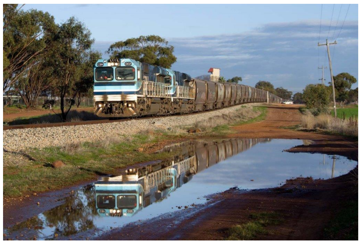
CBHs 002 & 004 reflect as they haul 5K23 through East Northam, 18^{\rm th} July.