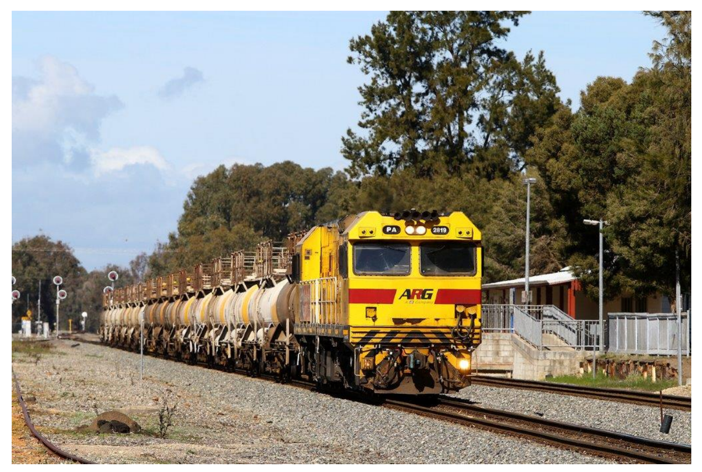
PA2819 leads an empty caustic train through Pinjarra, 18<sup>th</sup> August.