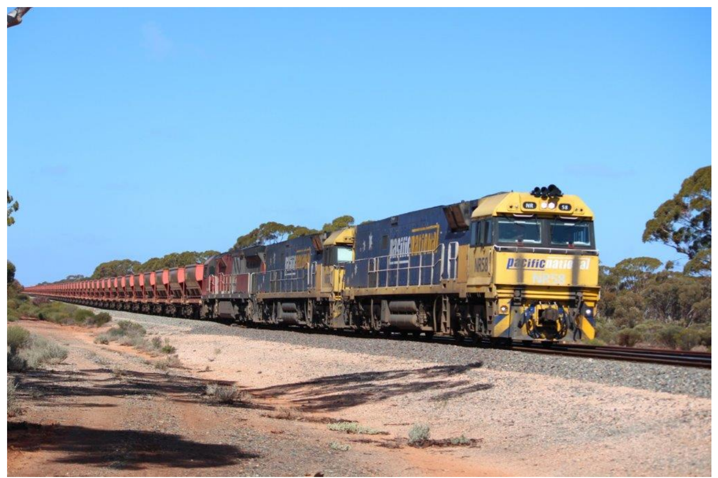
NRs 58 & 67 lead MRL002 on 1030 empty ore, Ballast Rd, Hampton, 18<sup>th</sup> August. Page 5 of 12