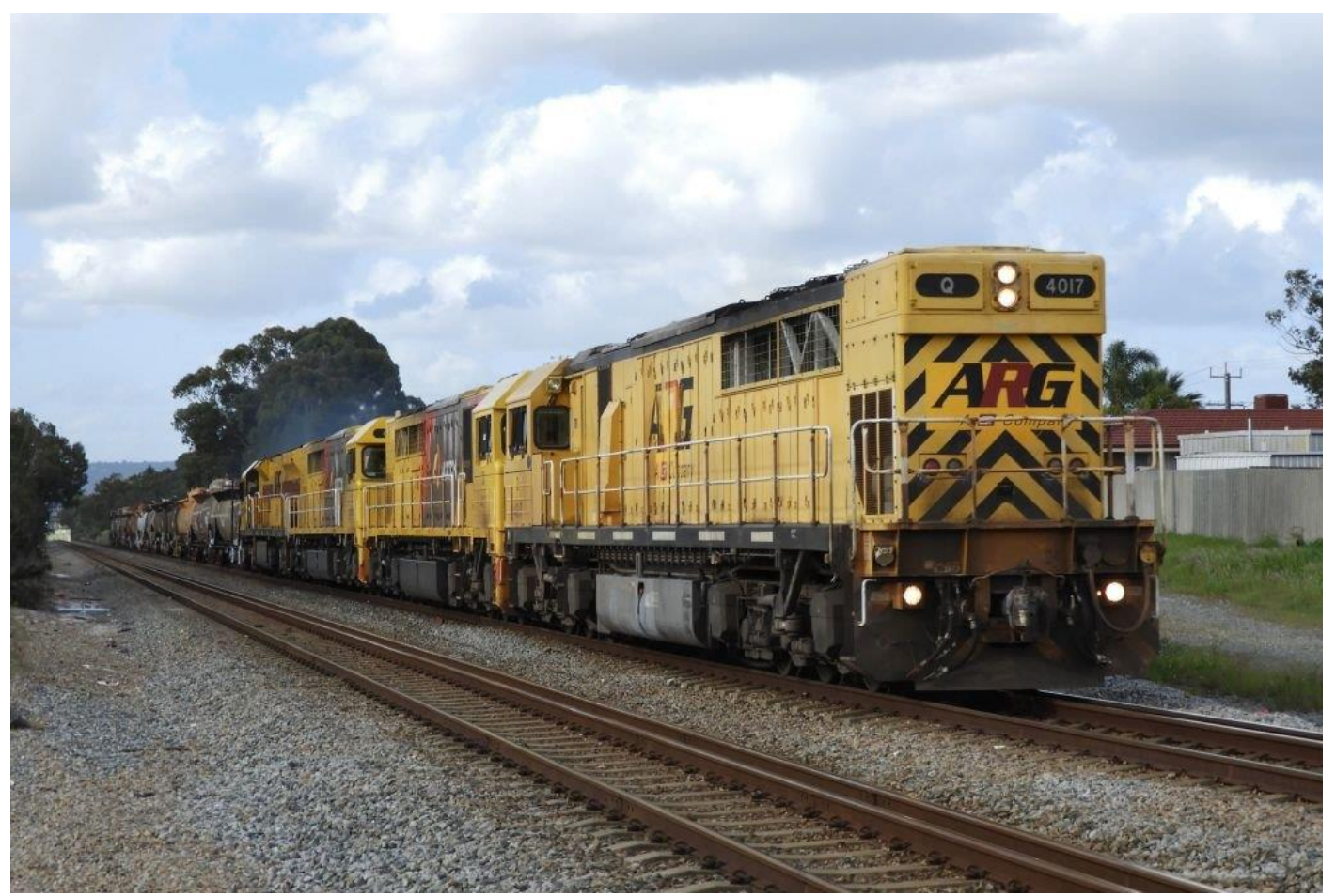
Qs 4017, 4011, 4006 & AC4301 run 6158 fuel shunt from Forrestfield to Kwinana, Thornlie, 30/9. Page 12 of 12