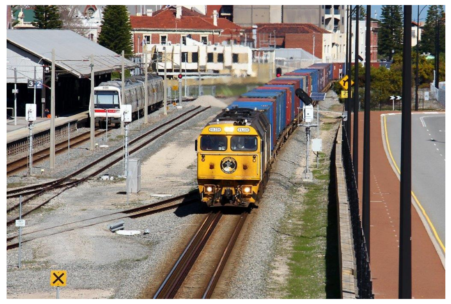
FL220 & HL203 chatter through Fremantle with 2142 container shuttle, 19<sup>th</sup> August.