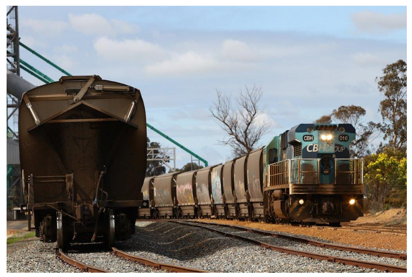
CBH016 loads a grain rake at Broomehill, 16<sup>th</sup> August.