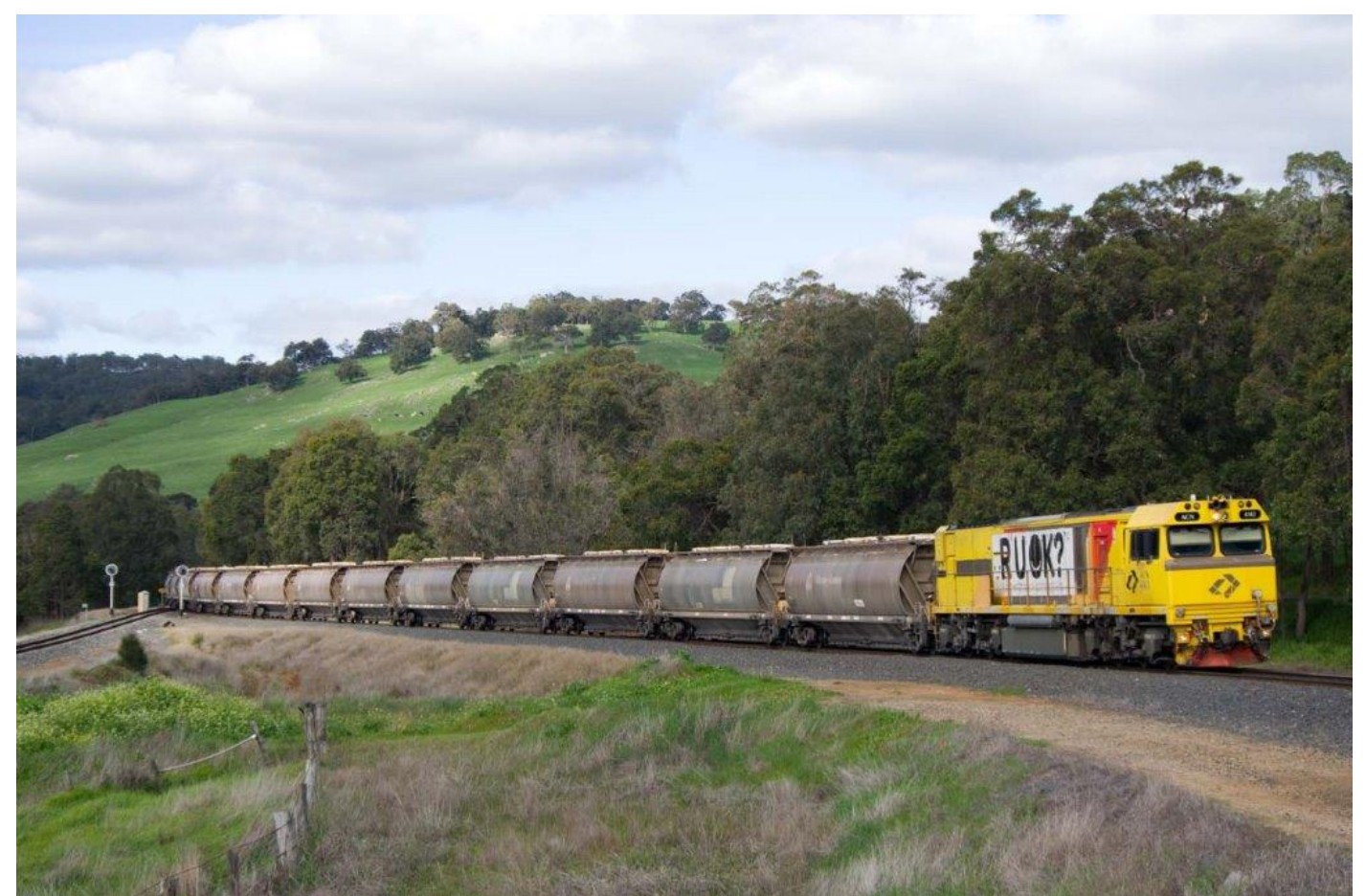
Train 7832 passes Brunswick East behind ACN4143, 24<sup>th</sup> August.