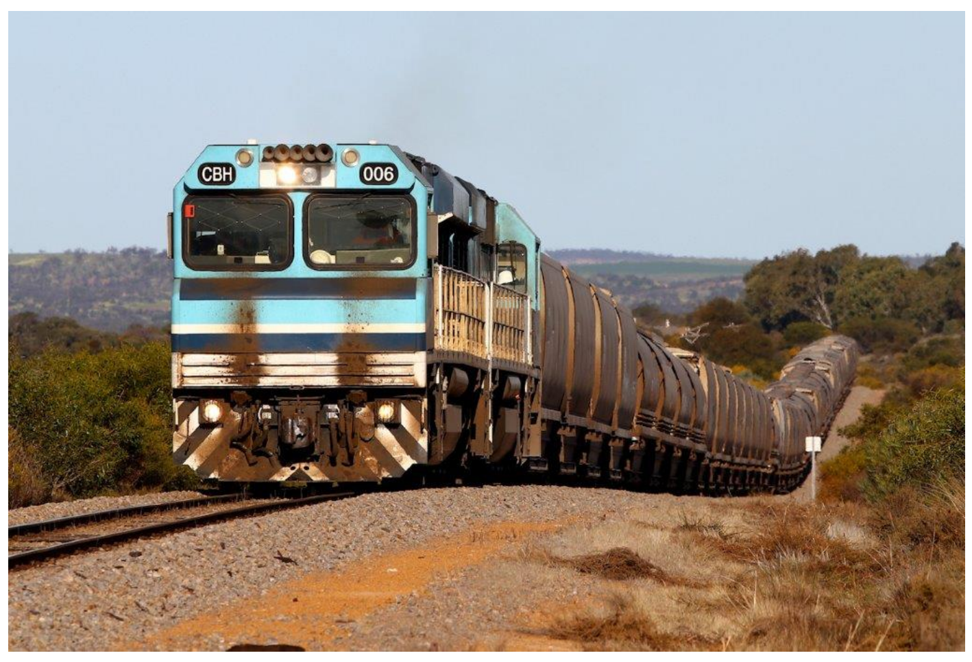
CBHs 006 & 001 drag 2G51 loaded grain through the roller coaster at Yandanooka, 19th August.