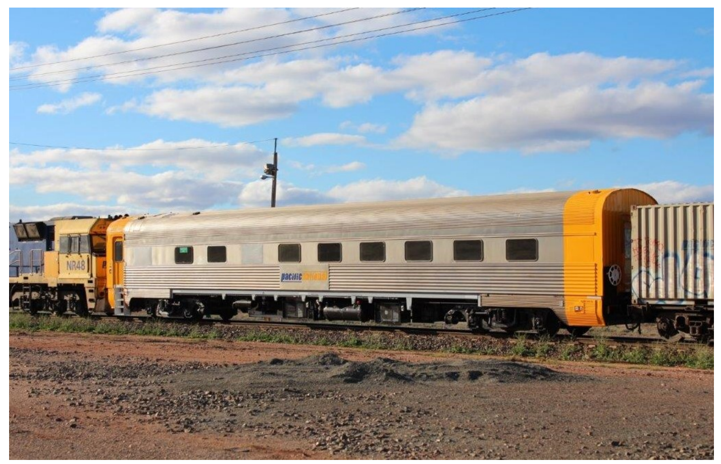
After three years in storage, RZBY911 has been refurbished and returned to service; Parkeston, 23<sup>rd</sup> August.