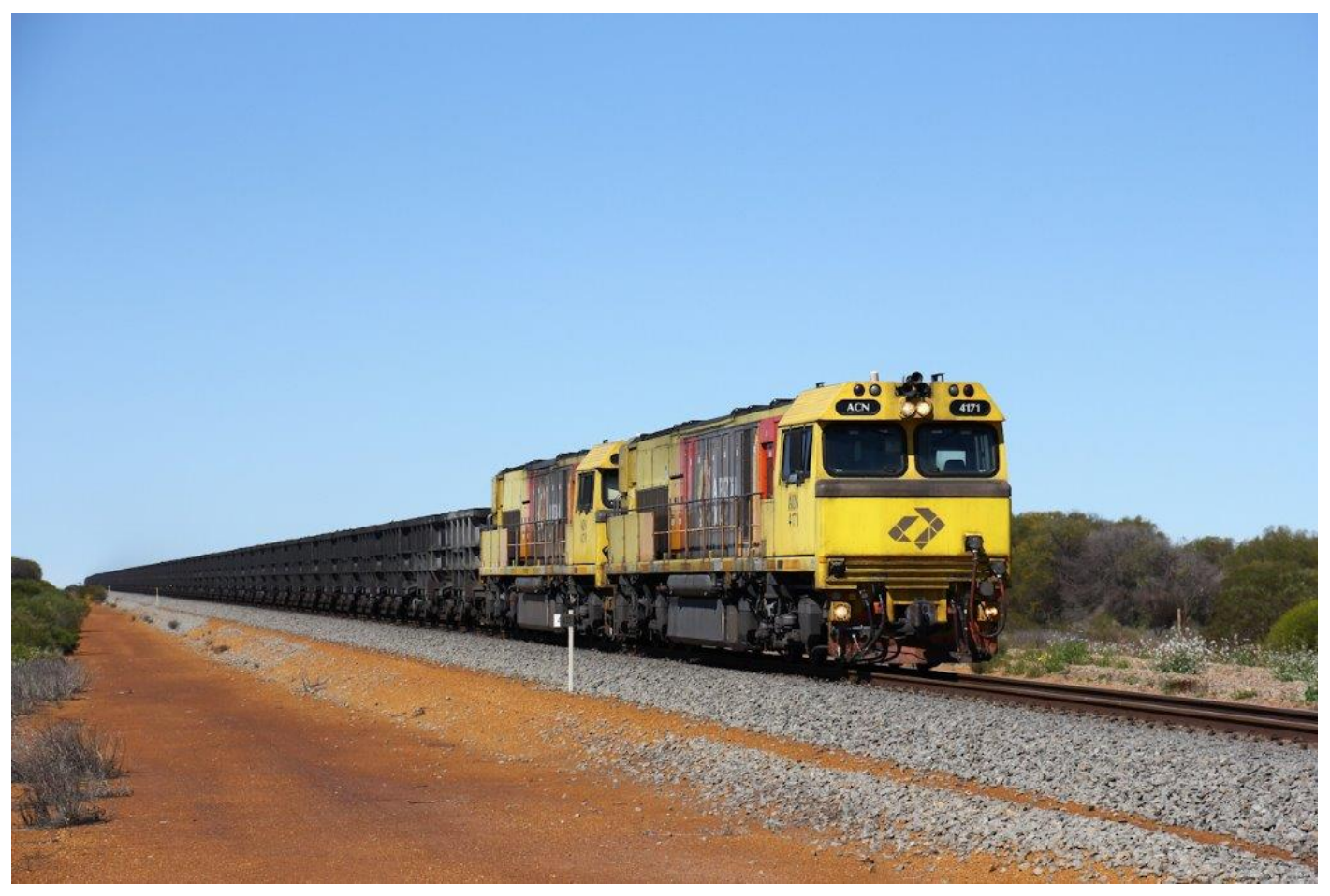
ACNs 4171 & 4170 lead 1763 loaded Karara ore through Kara Curara, 25<sup>th</sup> August. Both photo