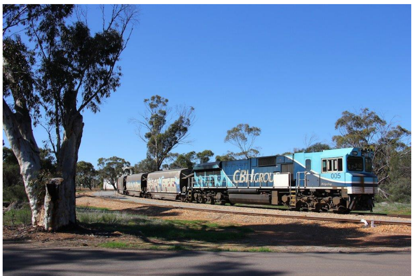
CBH005 stands on a grain rake at Moora CBH, 19<sup>th</sup> August. Page 6 of 12