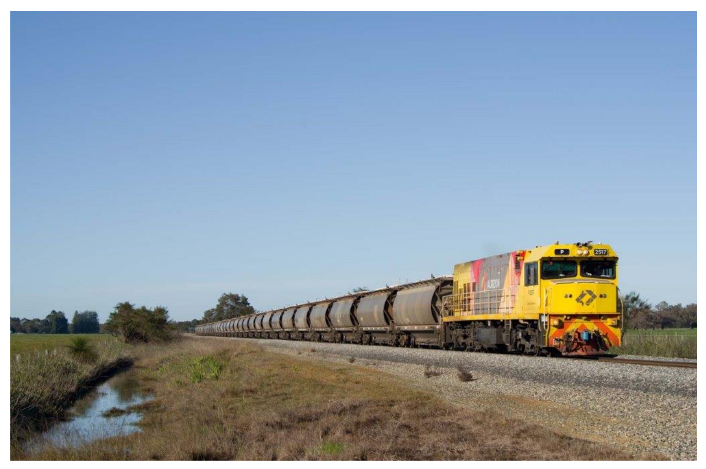
P2517 runs train 7872 through Pinjarra, 24<sup>th</sup> August.