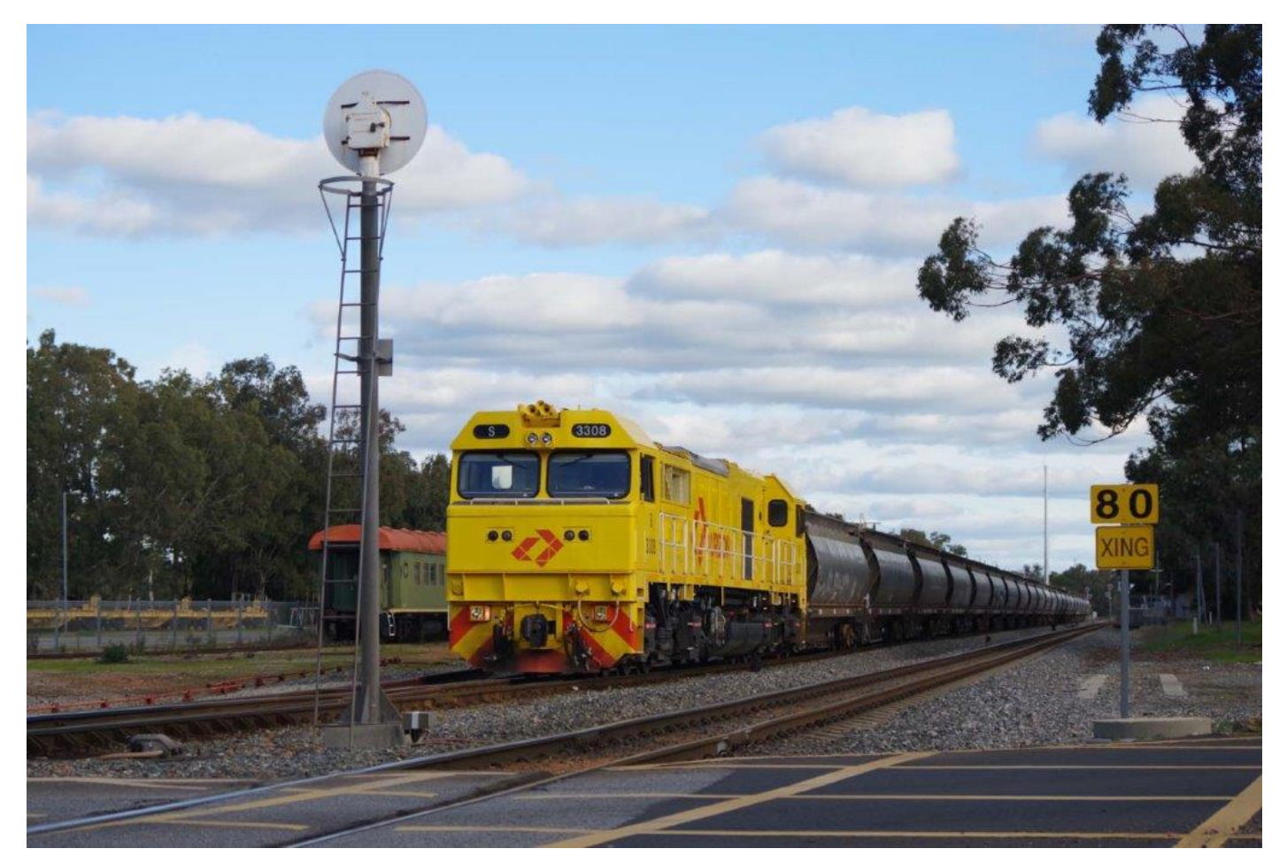
S3308 hauls train 7224 through Pinjarra, 24<sup>th</sup> August.