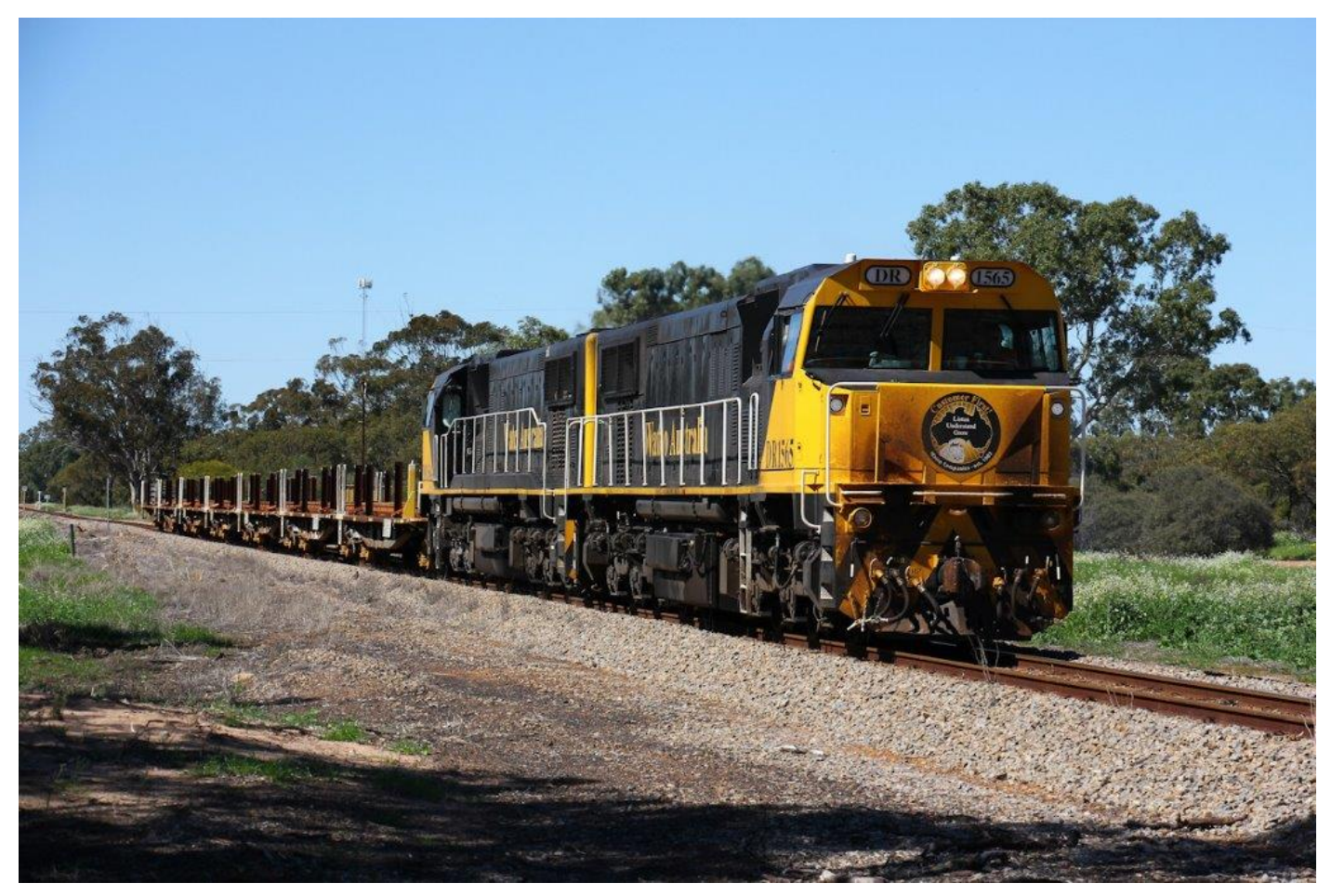
Their first run to the Midwest, DRs 1565 & 1564 lead 3RT1 rail train through Irwin, 27/8.