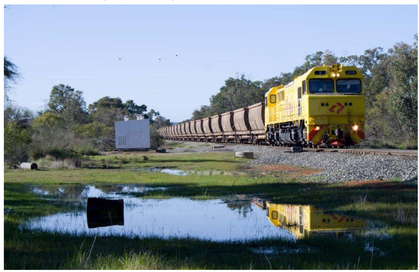
The puddle reflects S3310 on train 7968 at Pinjarra East, 24<sup>th</sup> August.