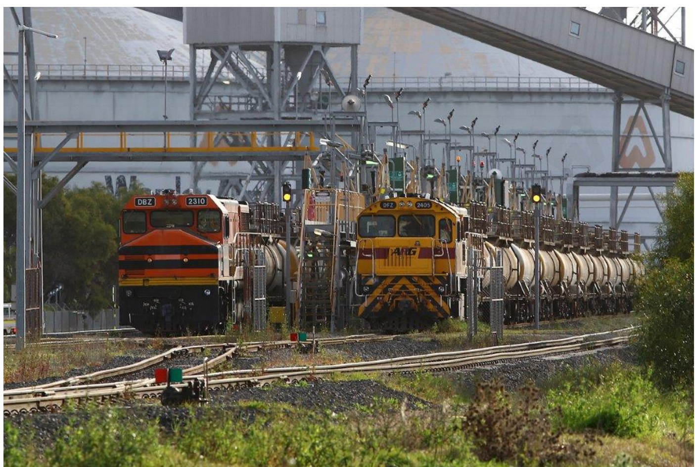
DBZ2310 & former Queensland loco DFZ2405 with caustic trains at Bunbury port, 17<sup>th</sup> August. Page 3 of 12