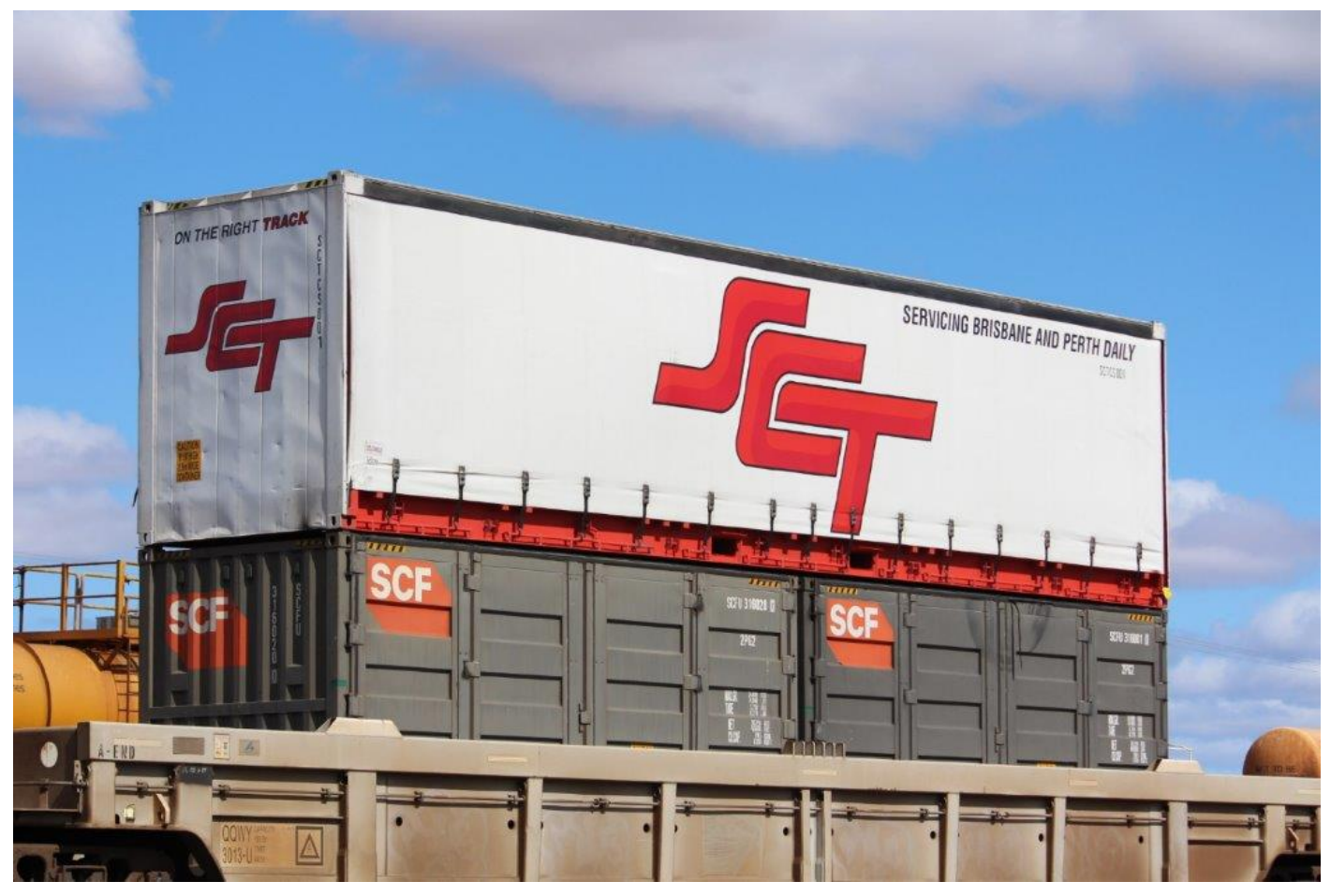
A pre-loved curtainsider has joined the SCT fleet as SCTCS001, 24<sup>th</sup> August.