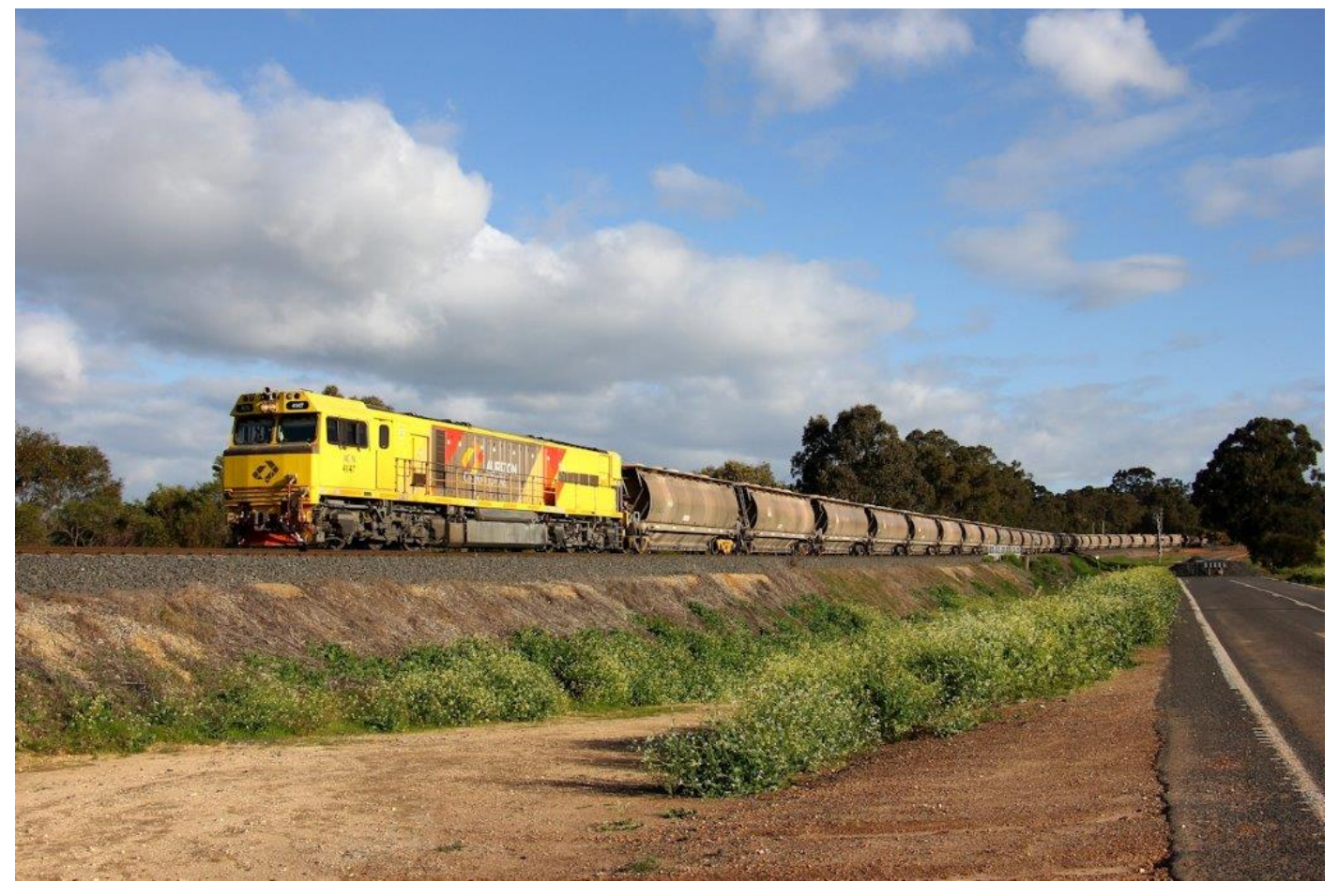
An empty Worsley alumina rake is led through Roelands by ACN4147, 17<sup>th</sup> August.