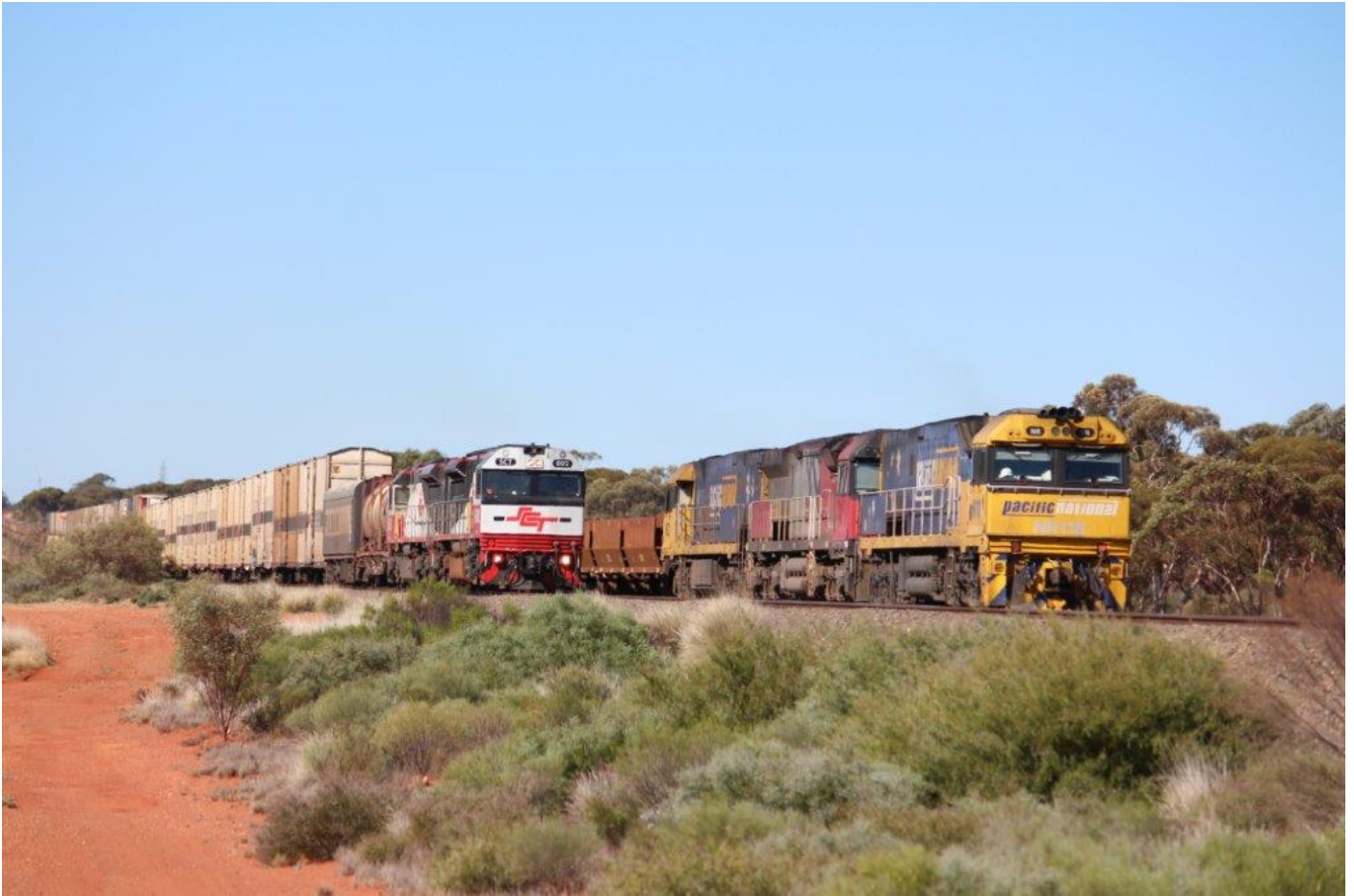
Clean SCTs 002 & 001 on 5MP9 overtake NR118, MRL003 & NR21 on 7030, Binduli, 5/10.