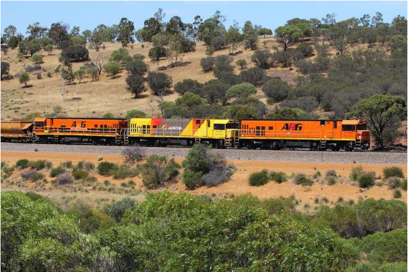
7721 loaded Mt Gibson ore rolls through Bringo behind Ps 2516, 2506 & 2503, 19/10.