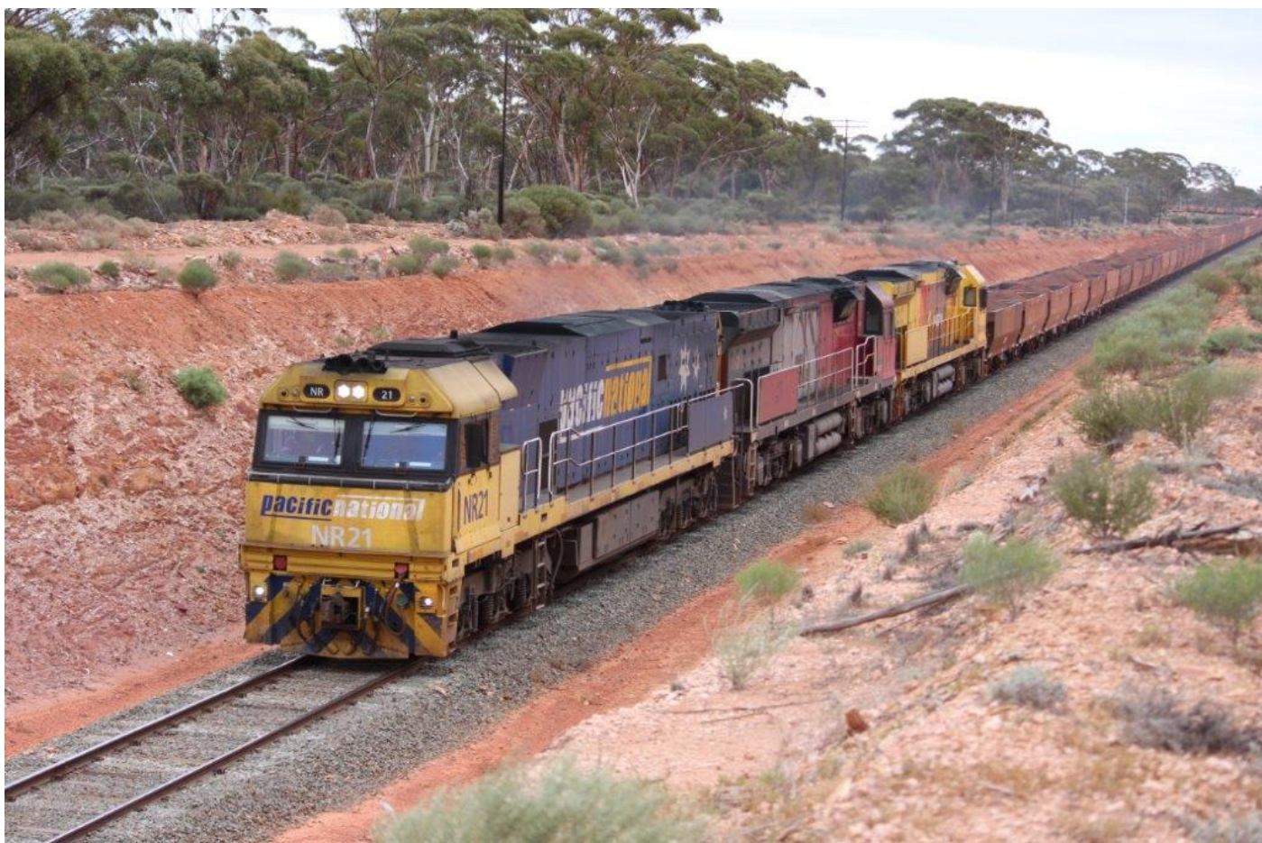
NR21, MRL003 & ACB4402 depart Binduli with 7035 to Esperance, 12 th October.