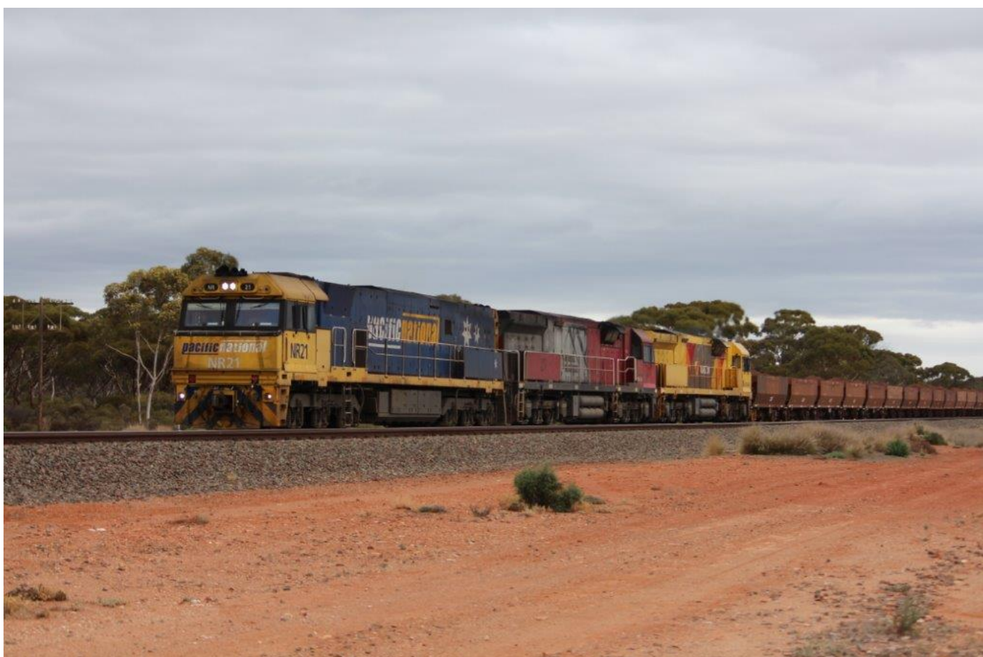
NR21, MRL003 & ACB4402 lead 7035, the leased WOE rake, onto Binduli west leg, 12 th October.