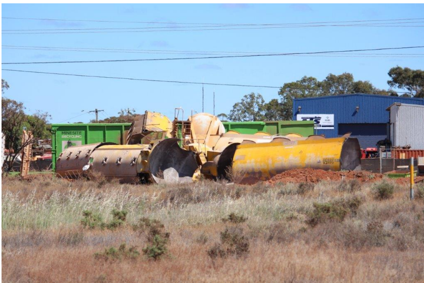
Former APNY lime/cement hoppers chopped up, Boulder, 6 th October.