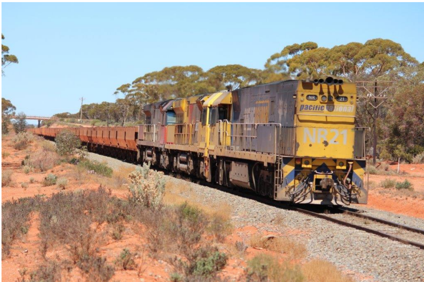
NR21, ACB4402 & MRL002 arrive at Binduli with 1030, 13/10. Esperance crew not qualified on the ACB, perhaps?