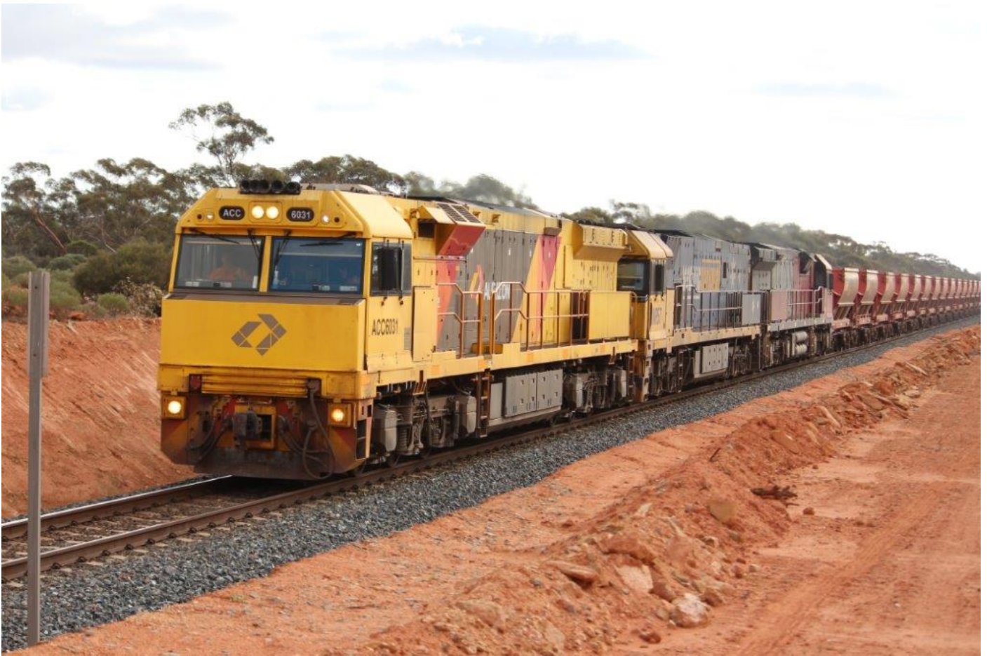
ACC6031, NR57 & MRL004 about to cross Kundana Road with 6036 to Koolyanobbing, 5 th October.