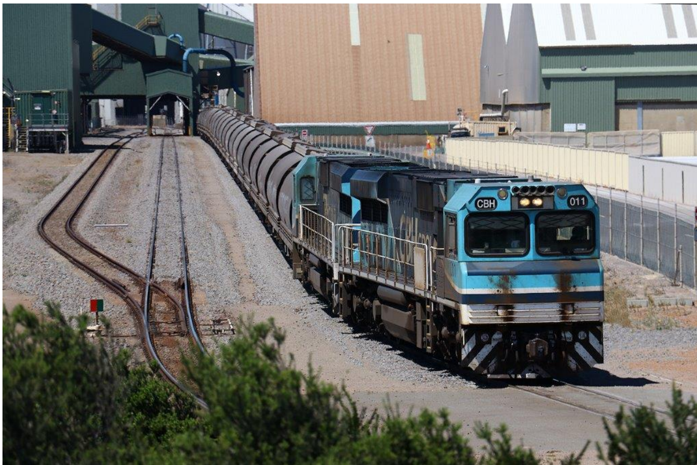
CBHs 011 & 001 at Geraldton Port with 2G30 empty grain to Perenjori, 14 th October.