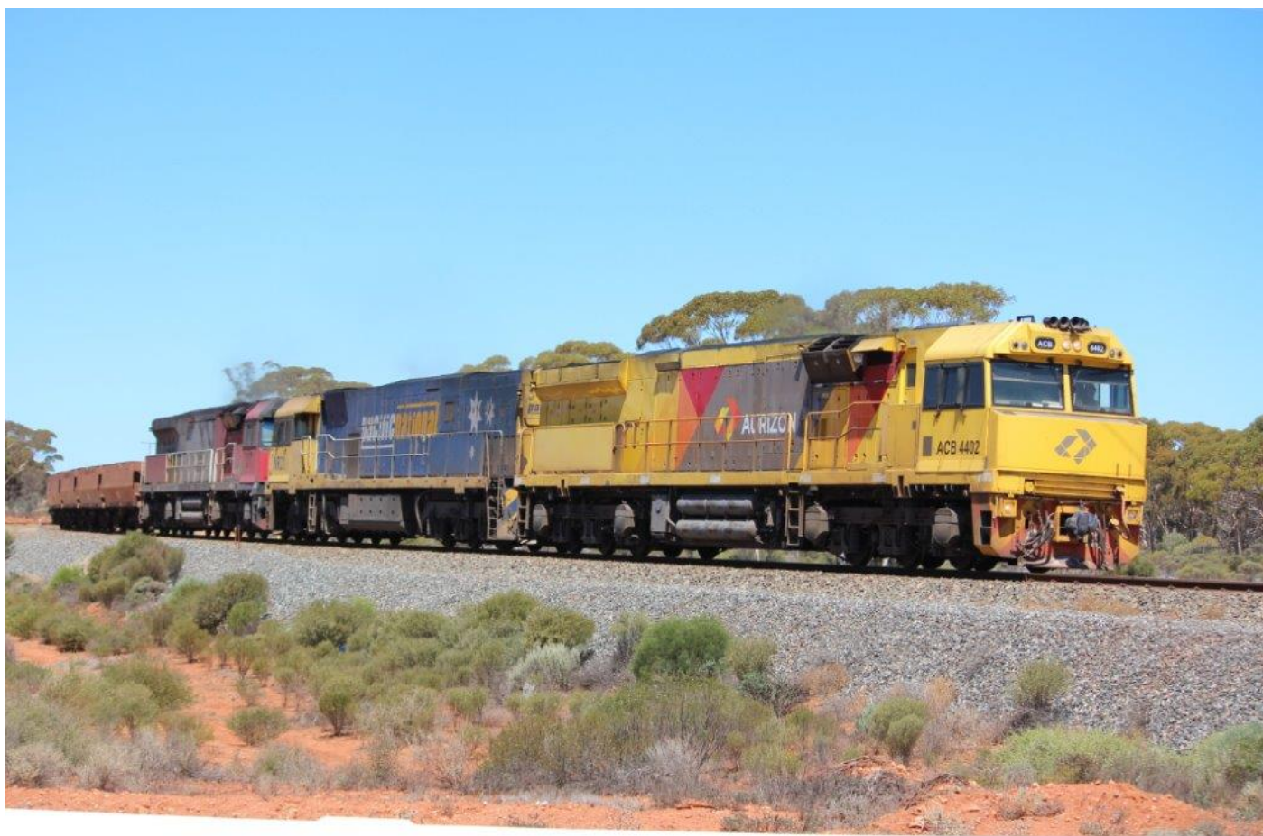
1030 departs Binduli behind rearranged ACB4402, NR21 & MRL002, 13 th October.