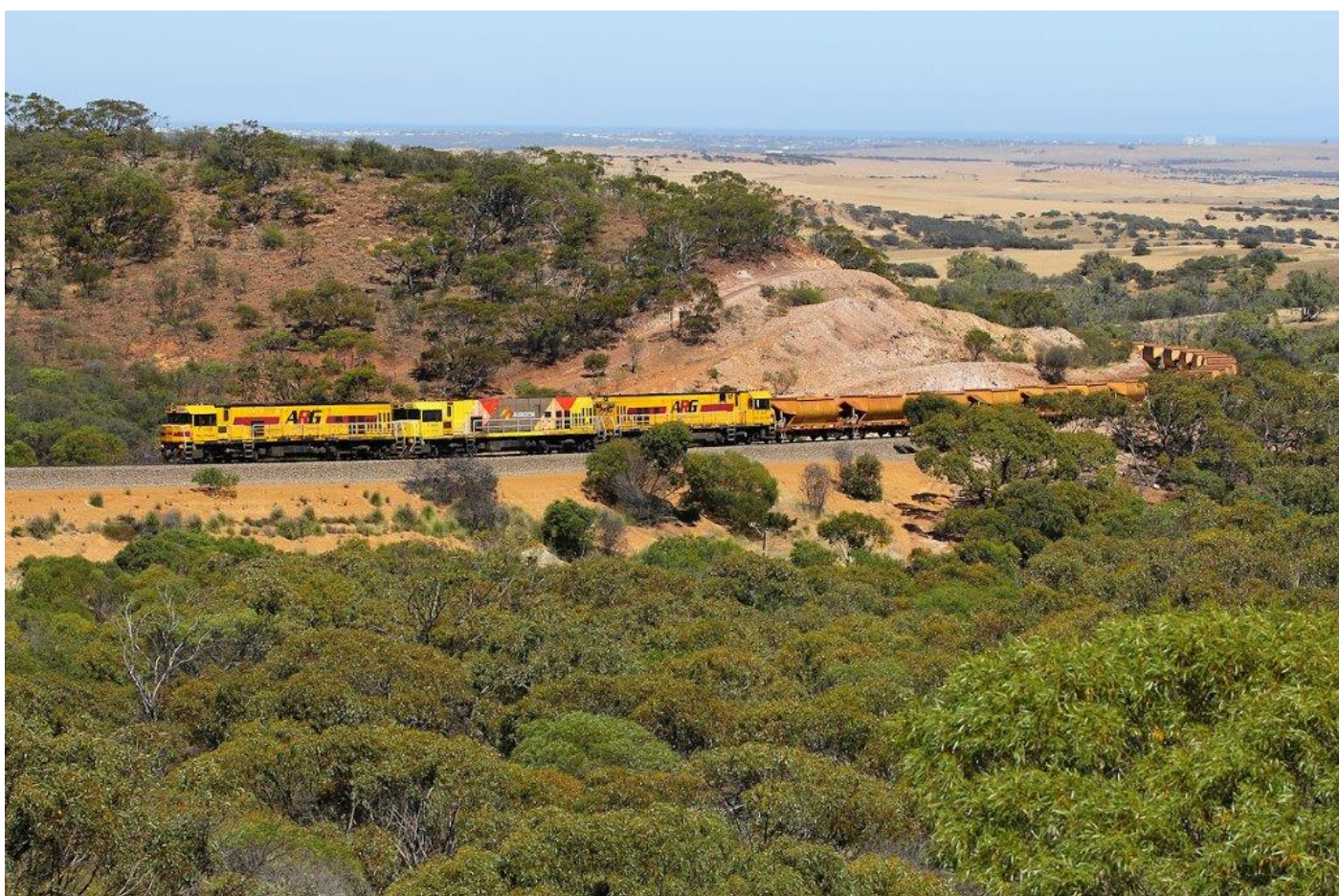
Ps 2508, 2505 & 2514 climb through Bringo with 7720 empty Mt Gibson ore, 19/10.