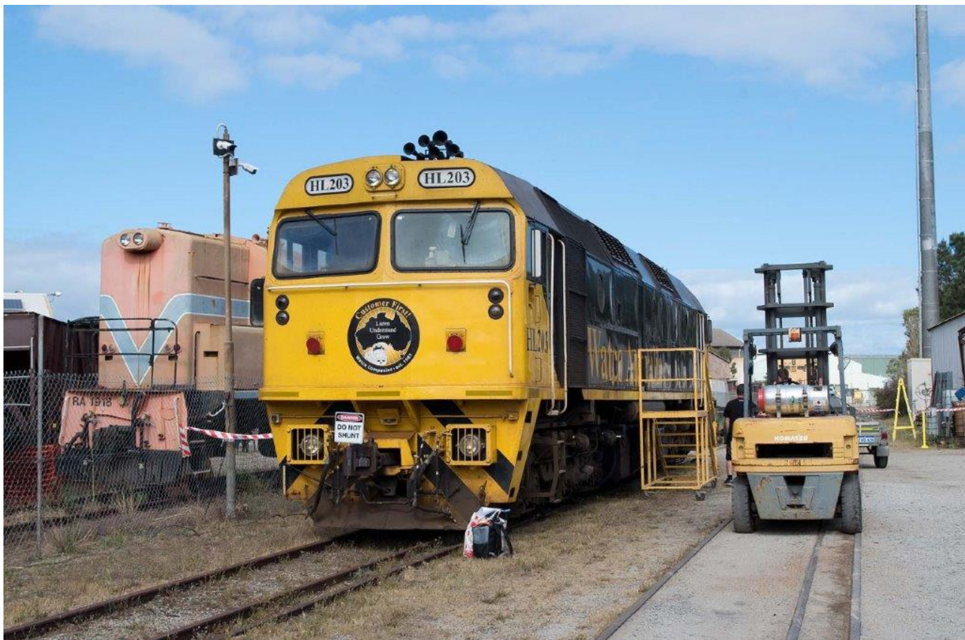
HL203 receives a service beside RA1918, RHWA museum, Bassendean, 13 th October.