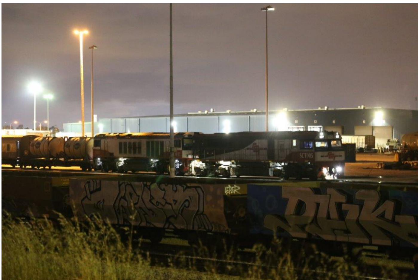
SCT005 & CSR002 wait to depart Forrestfield with 1PM9, 13 th October.