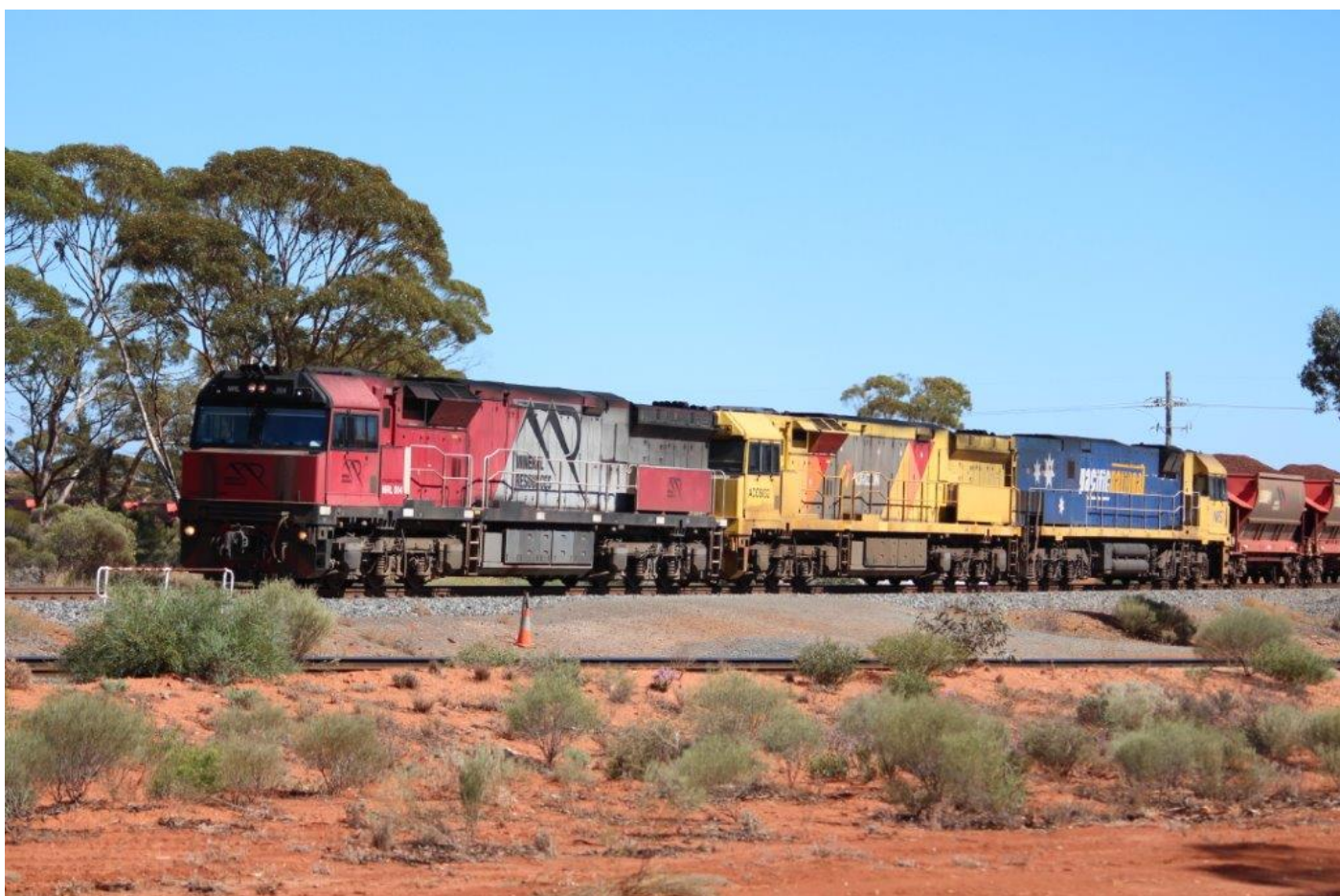
MRL004, ACC6032 & NR57 await crew change on 1031, Binduli, 13 th October.