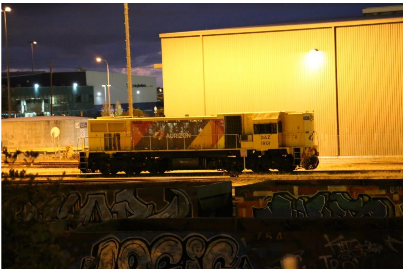
DAZ1901 under lights at Forrestfield, 12 th October.