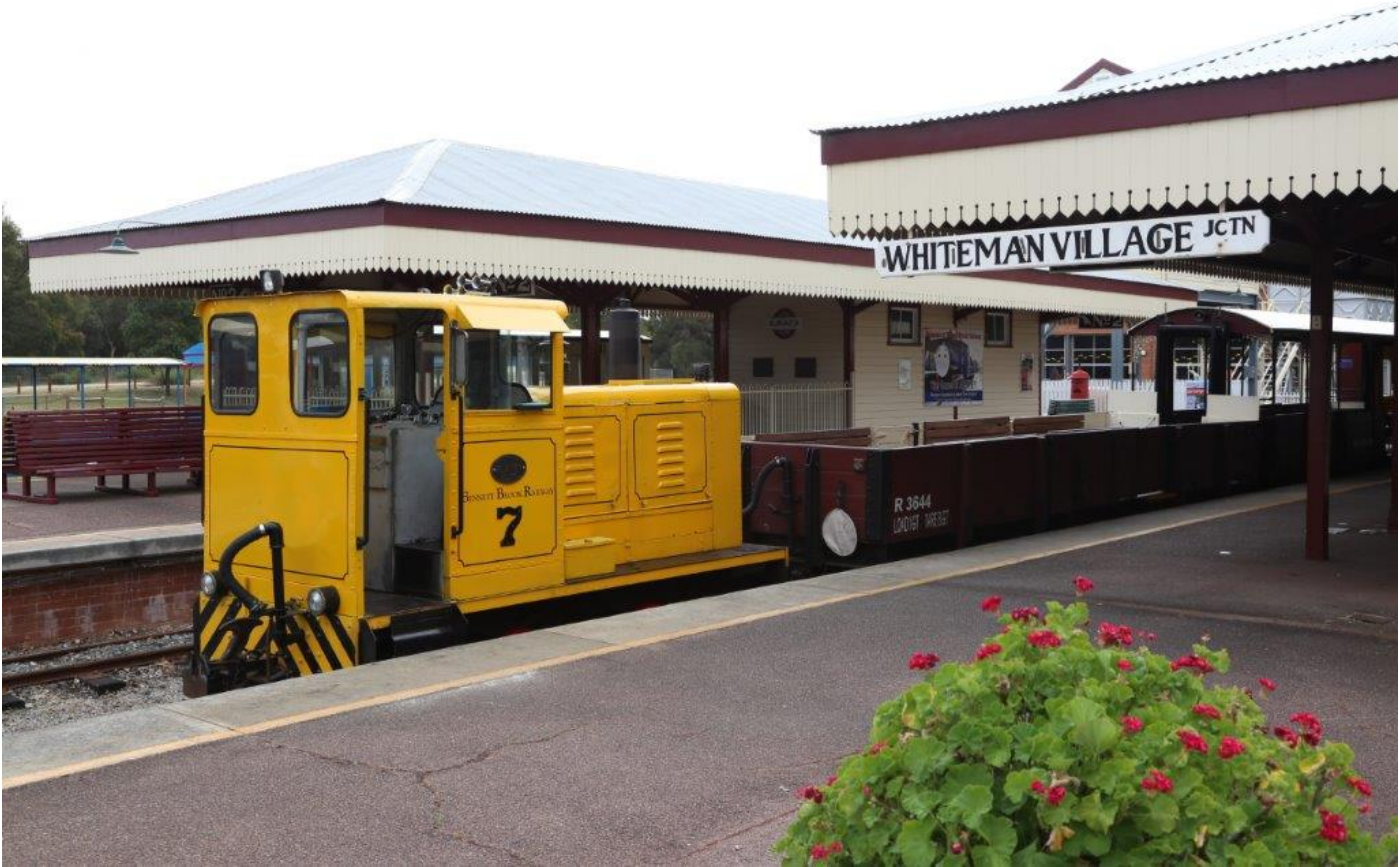
BBR #7 at Whiteman Village Junction, 5 th October. Page 6 of 24