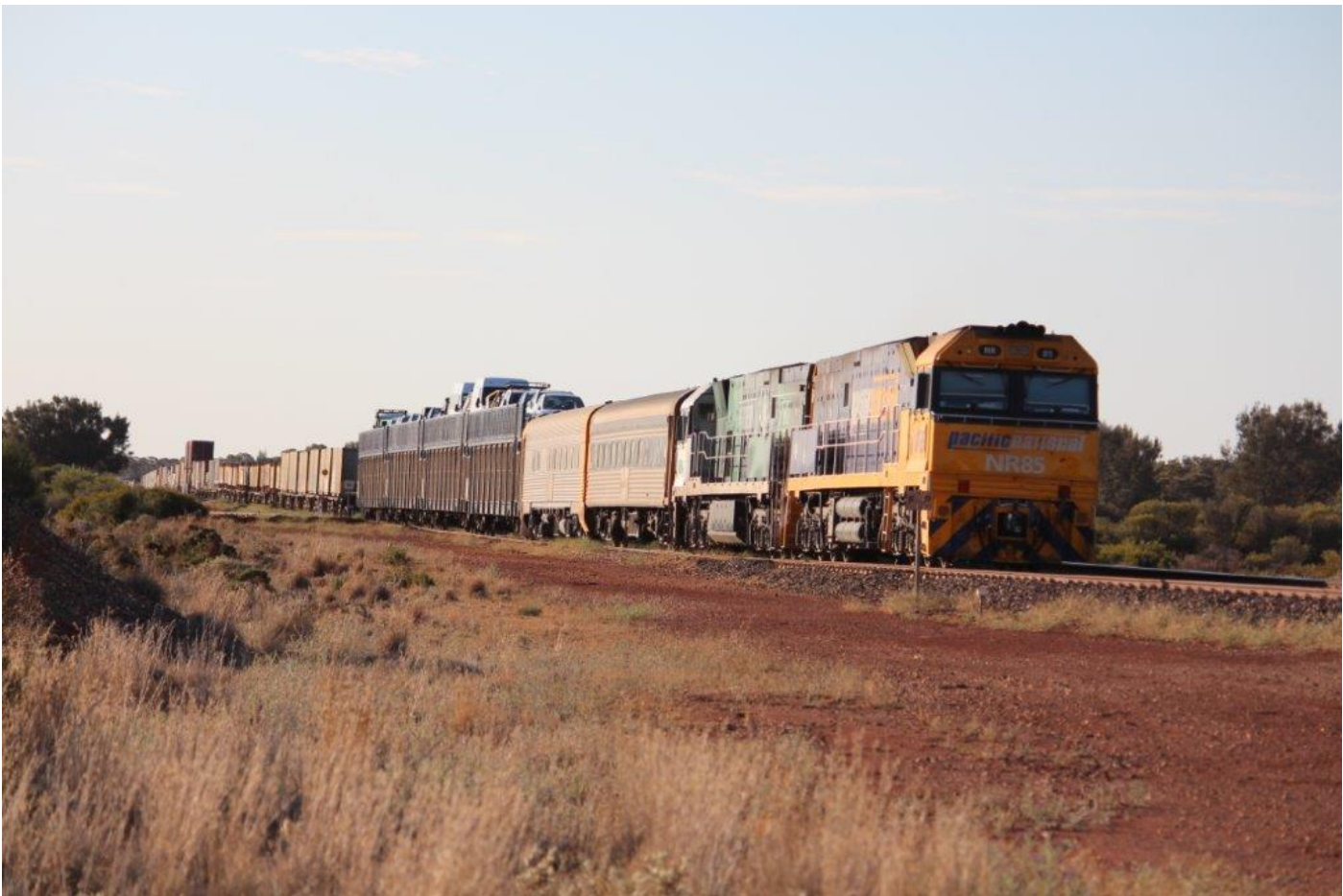
NRs 85 & failed 84 on 4PM6, stabled at Golden Ridge awaiting a relief loco, 3/10.