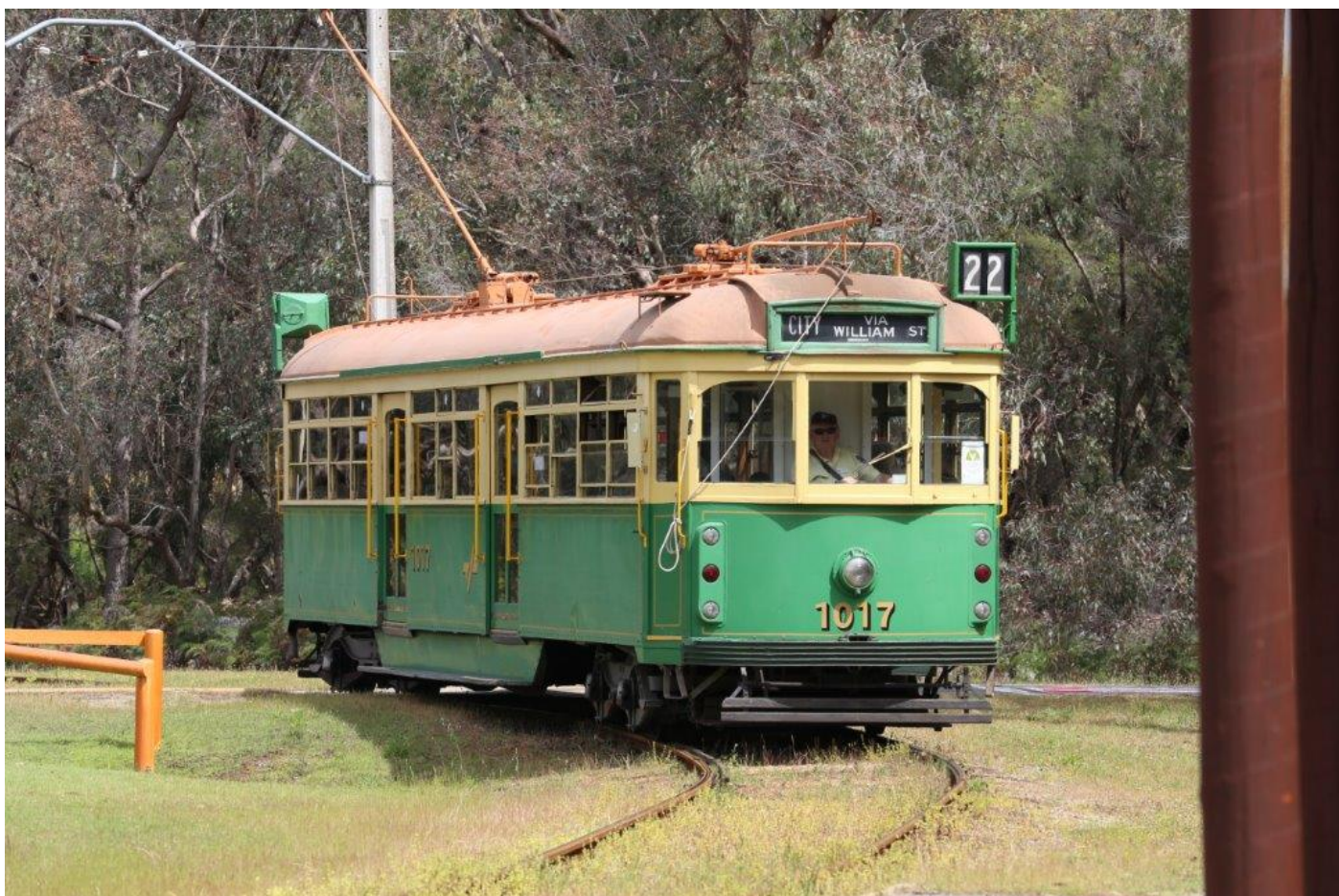
The destination board is a little wrong - former Melbourne W class tram 1017 at Whiteman Park, 5 th October.