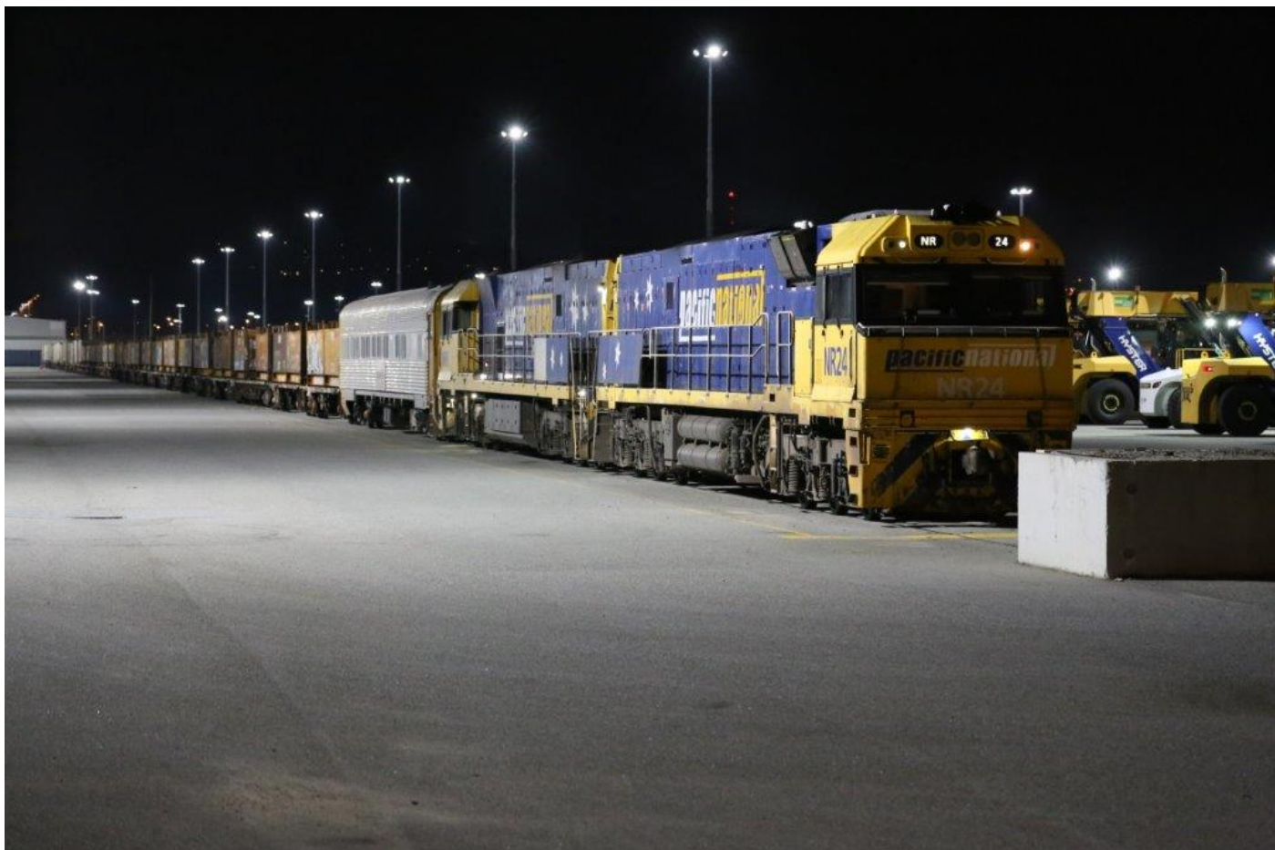
NRs 24 & 61 with 5MP2 at the buffer stop, Kewdale, 13 th October. PN containers galore in the below photo, awaiting delivery to their customers.