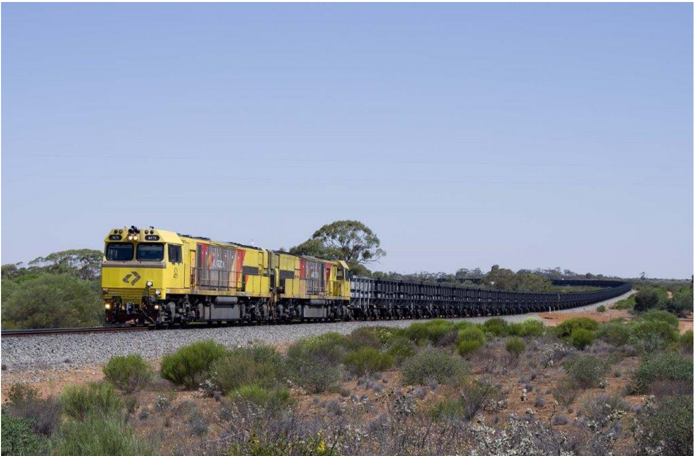
ACNs 4175 & 4172 (with 4174 at rear) pass through Tardun with 4173 Karara ore, 9 th October.