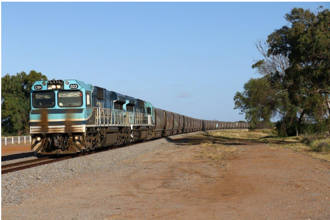
CBHs 023 & 001 at Georgina with 7G51 loaded grain ex Carnamah, 5 th October.