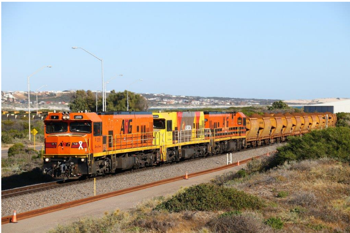
Ps 2516, 2506 & 2503 bring 1721 loaded Mt Gibson ore through Separation Point, 13/10.