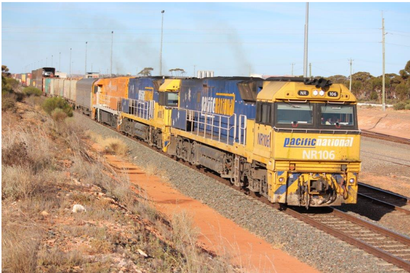
NRs 106, 8 & 31 blast away from West Kalgoorlie on 4MP5, 18 th October.