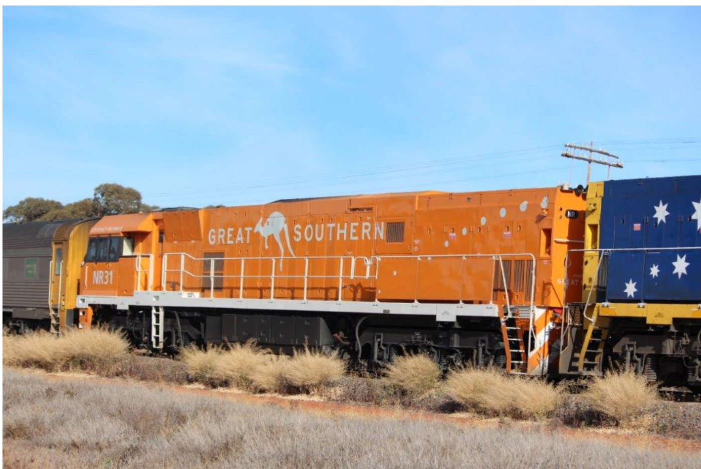
Journey Beyond's Great Southern scheme on NR31, 18 th October. NR30 has since received the same treatment.