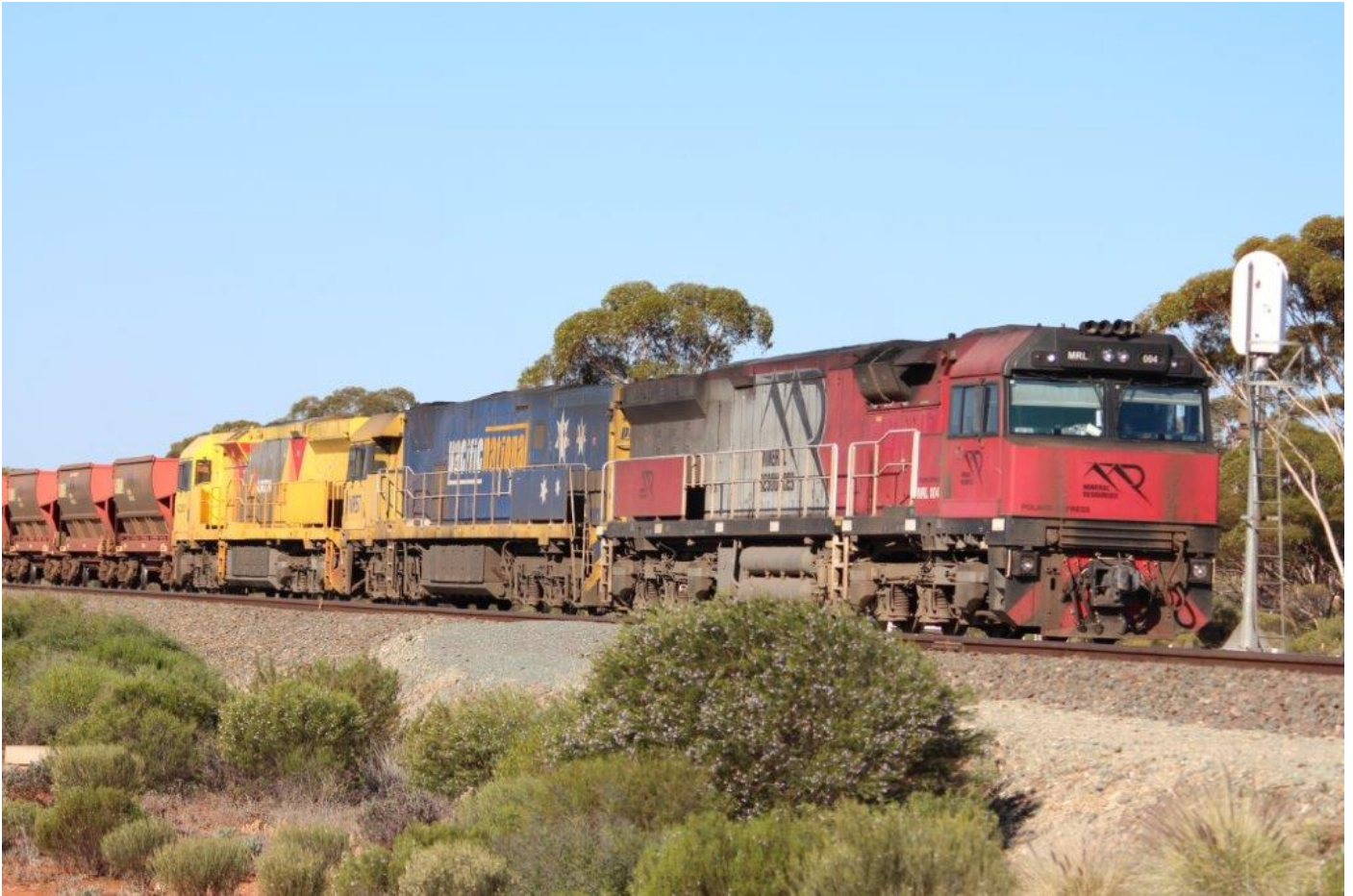
MRL004, NR57 & ACC6031 on 5036 at Binduli, the first use of a leased Aurizon unit by MinRes, 3 rd October.