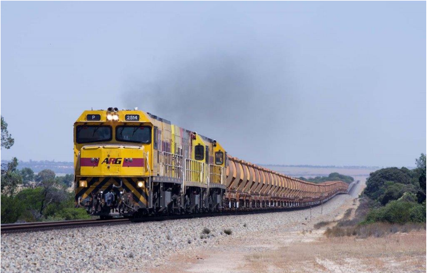
Ps 2514, 2505 & 2508 haul 4720 empty Mt Gibson ore through Nola, 9 th October.