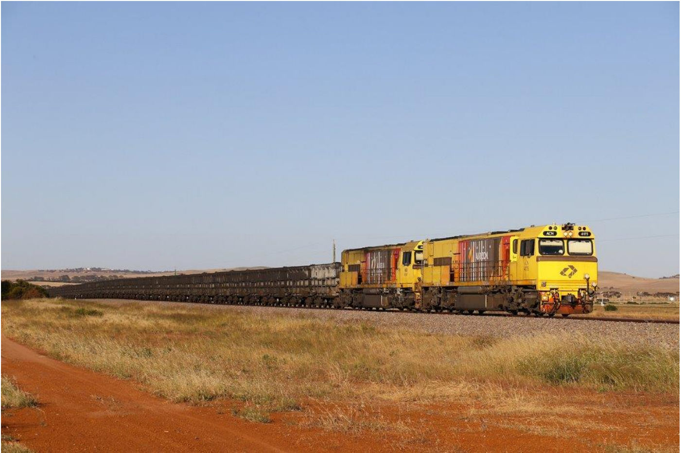
ACNs 4175 & 4141 depart Narngulu East on 2763 Karara ore to Geraldton Port, 7 th October.