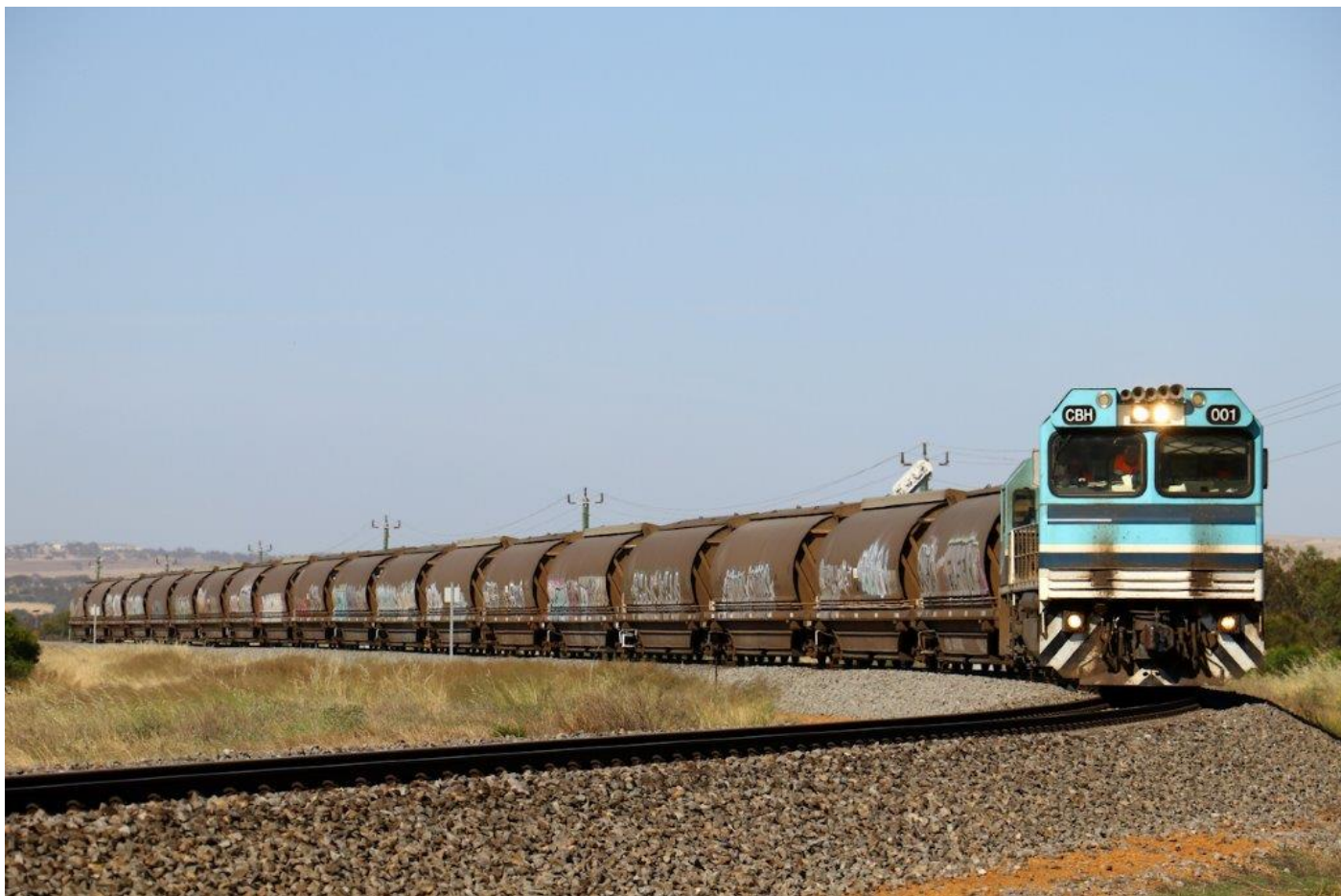
CBH001 leads sister 011 and 19 XT hoppers as 6G31at Narngulu, 18 th October.