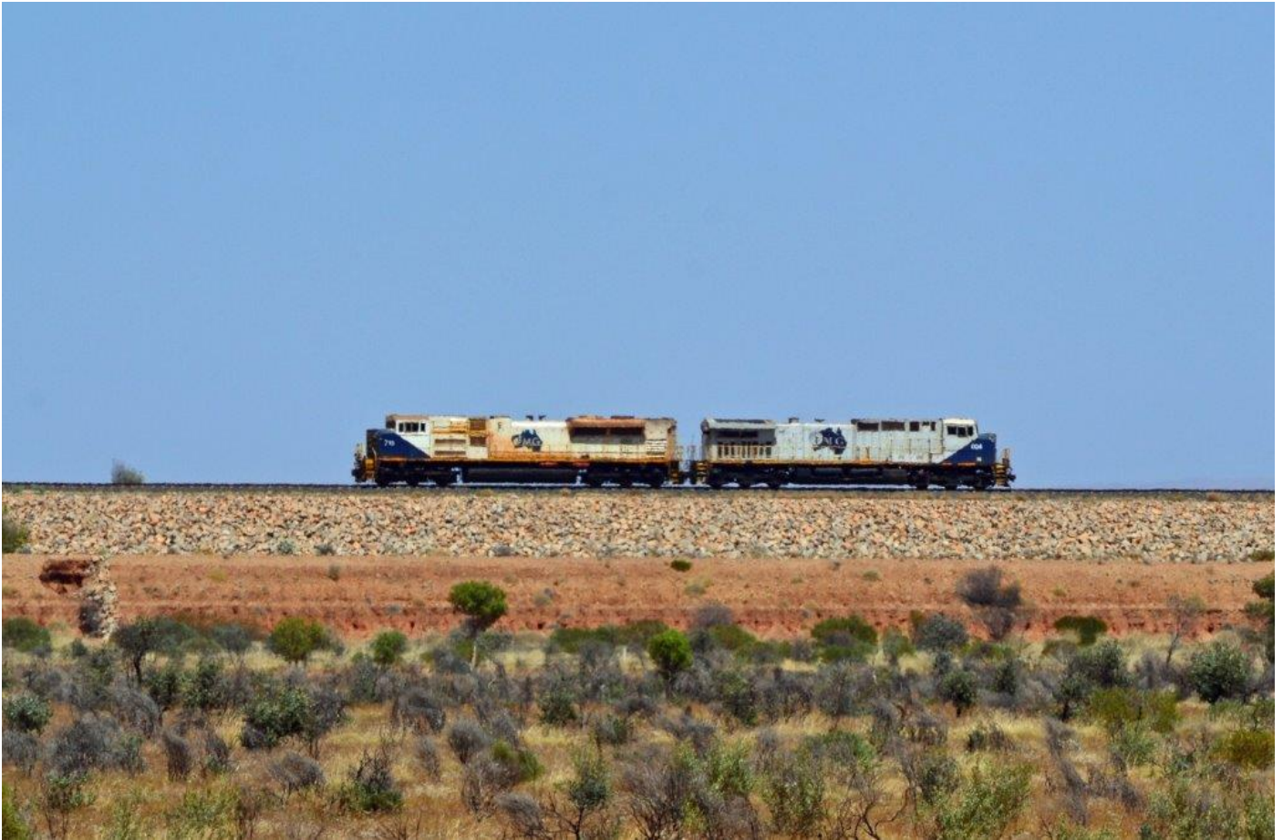
715 / 004 light to Cloudbreak mine to swap out the banker units, Woodstock, 3 rd October.