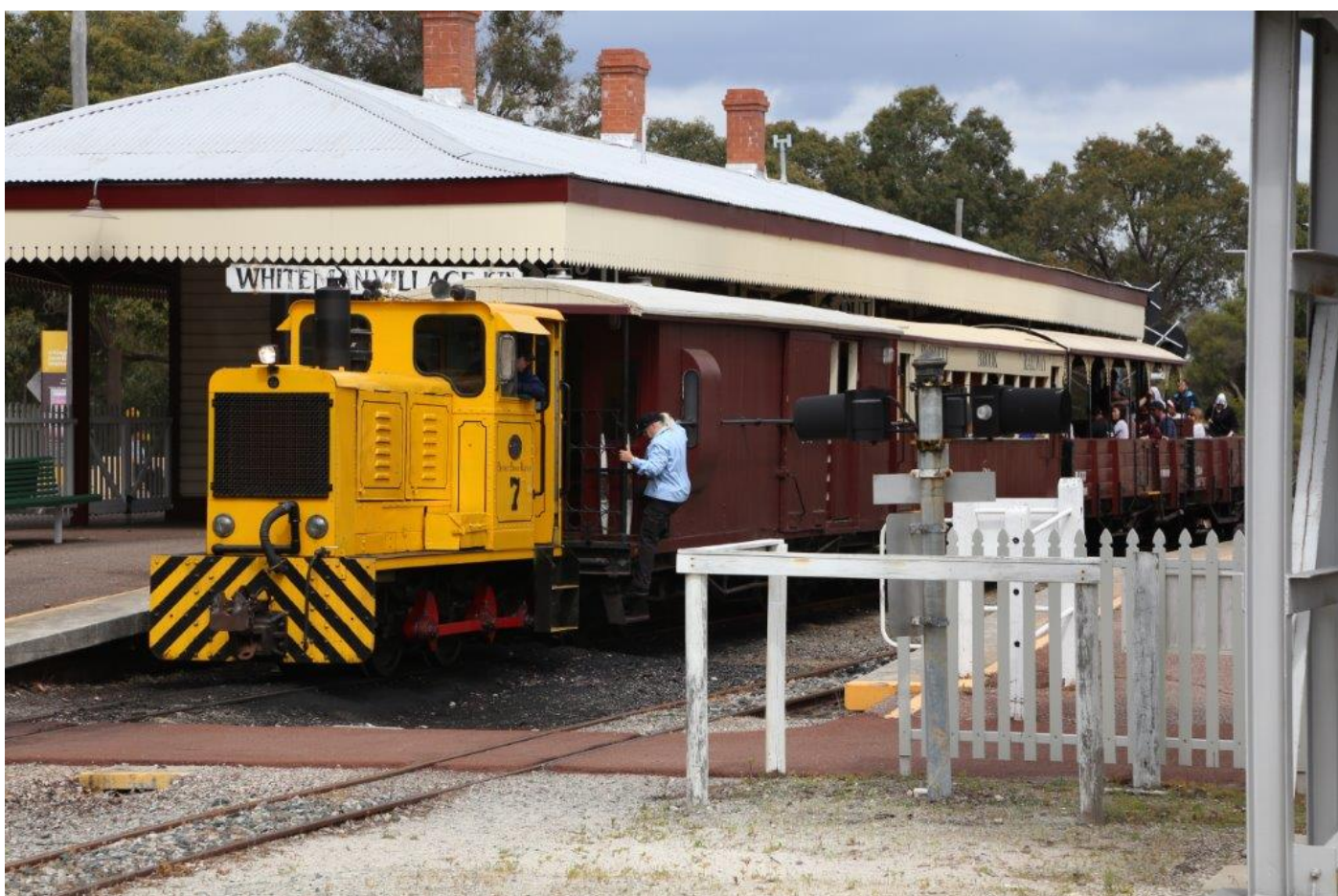
Bennet Brook Railway #7 – Planet at Whiteman Village Junction, 5 th October.