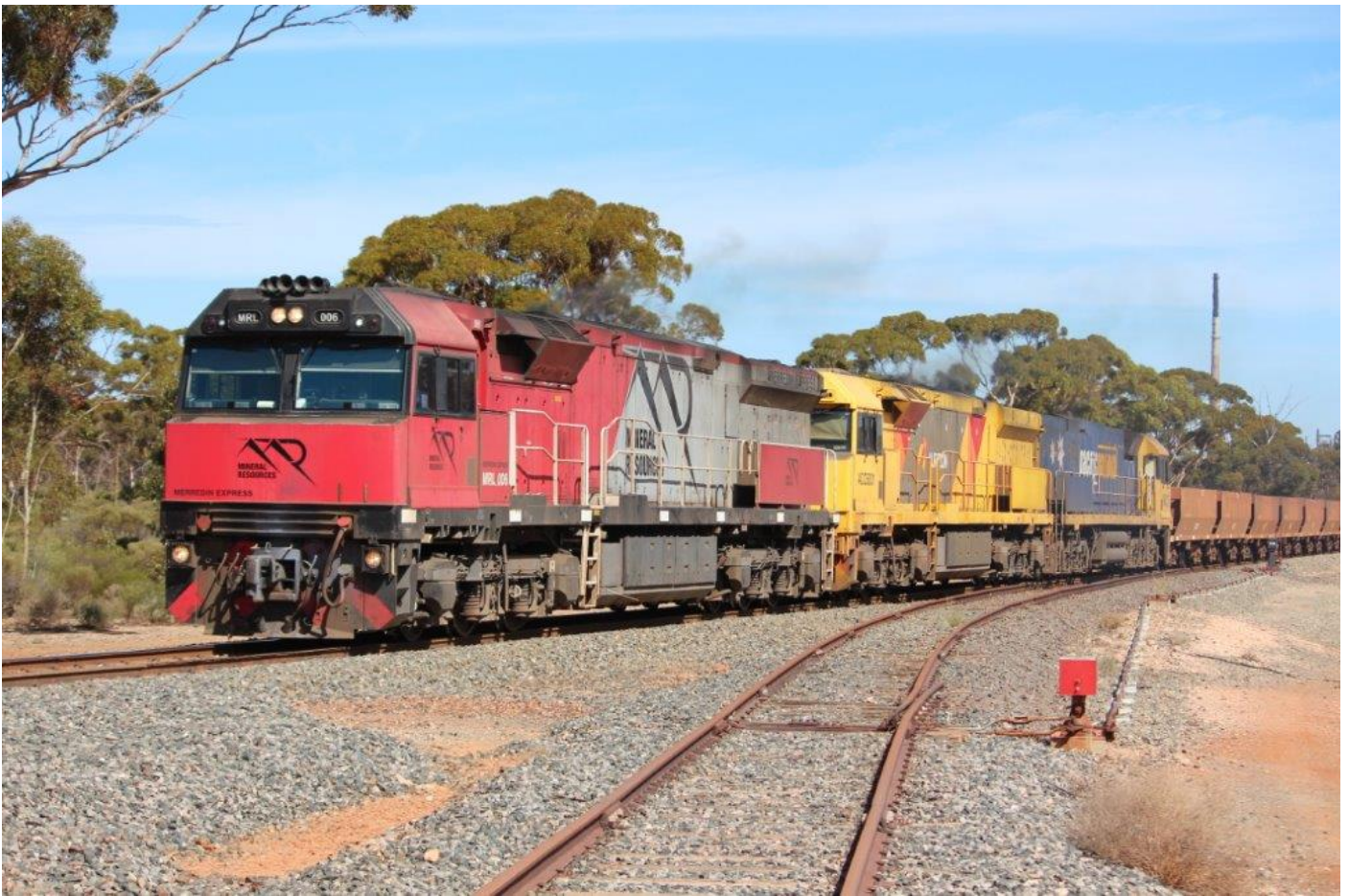
MRL006, ACC6031 & NR21 depart Hampton with 7030 empty ore, 19 th October.