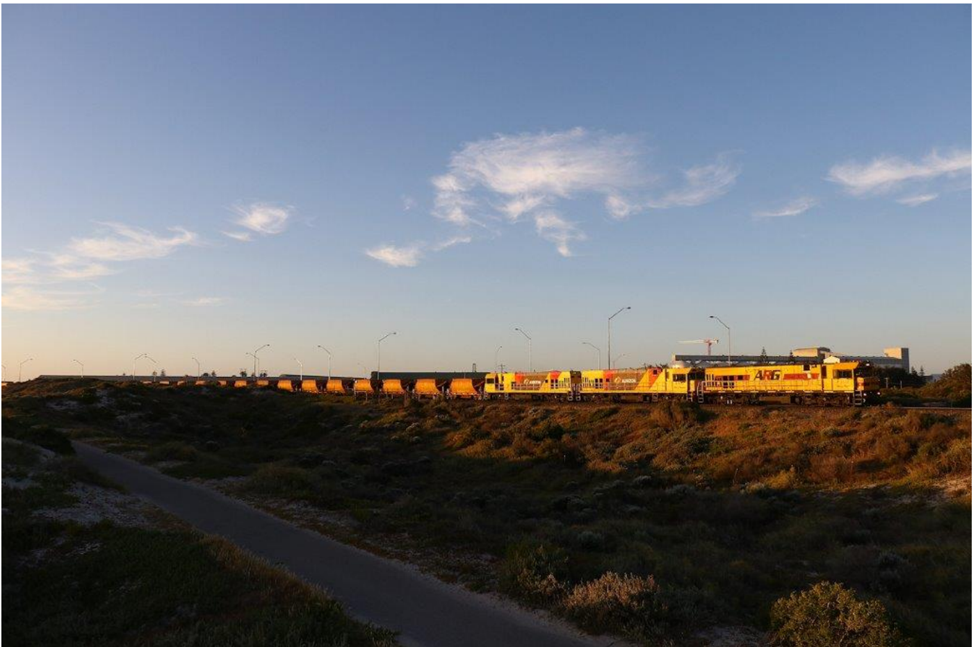
2722 empty Mt Gibson ore passes Separation Point behind Ps 2502, 2504 & 2506, 7/10.