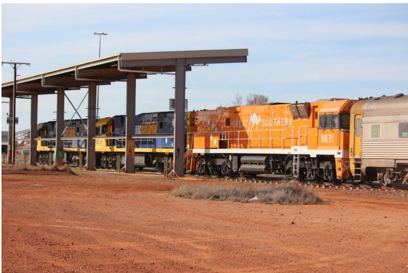
Freshly outshopped NR31 trails NRs 106 & 8 on 4MP5, Parkeston, 18 th October.