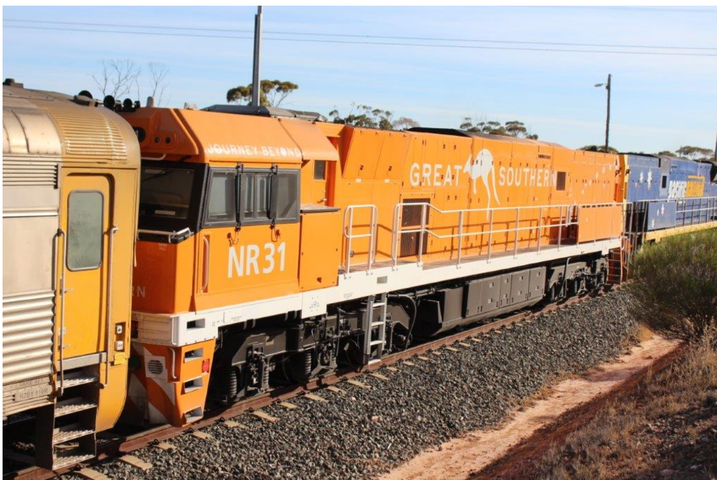
NR31 on 4MP5, West Kalgoorlie, 18 th October.