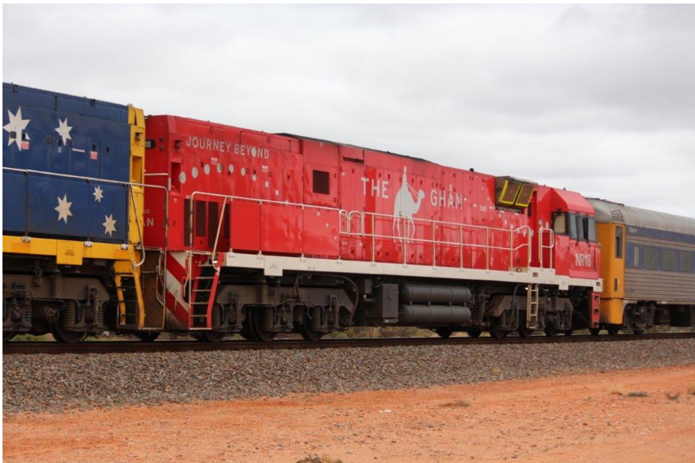
Former yellow Indian Pacific, now Ghan NR18 on 6PM7, Binduli, 12 th October.