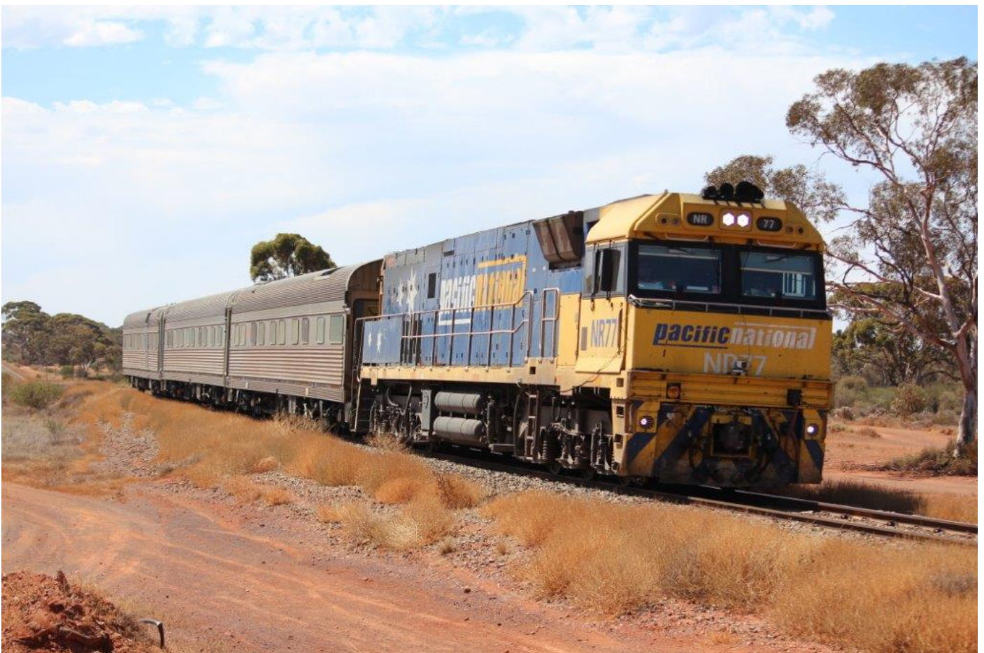
NR77 leads 7AK2 into Kalgoorlie ex Leonora, 19 th October.