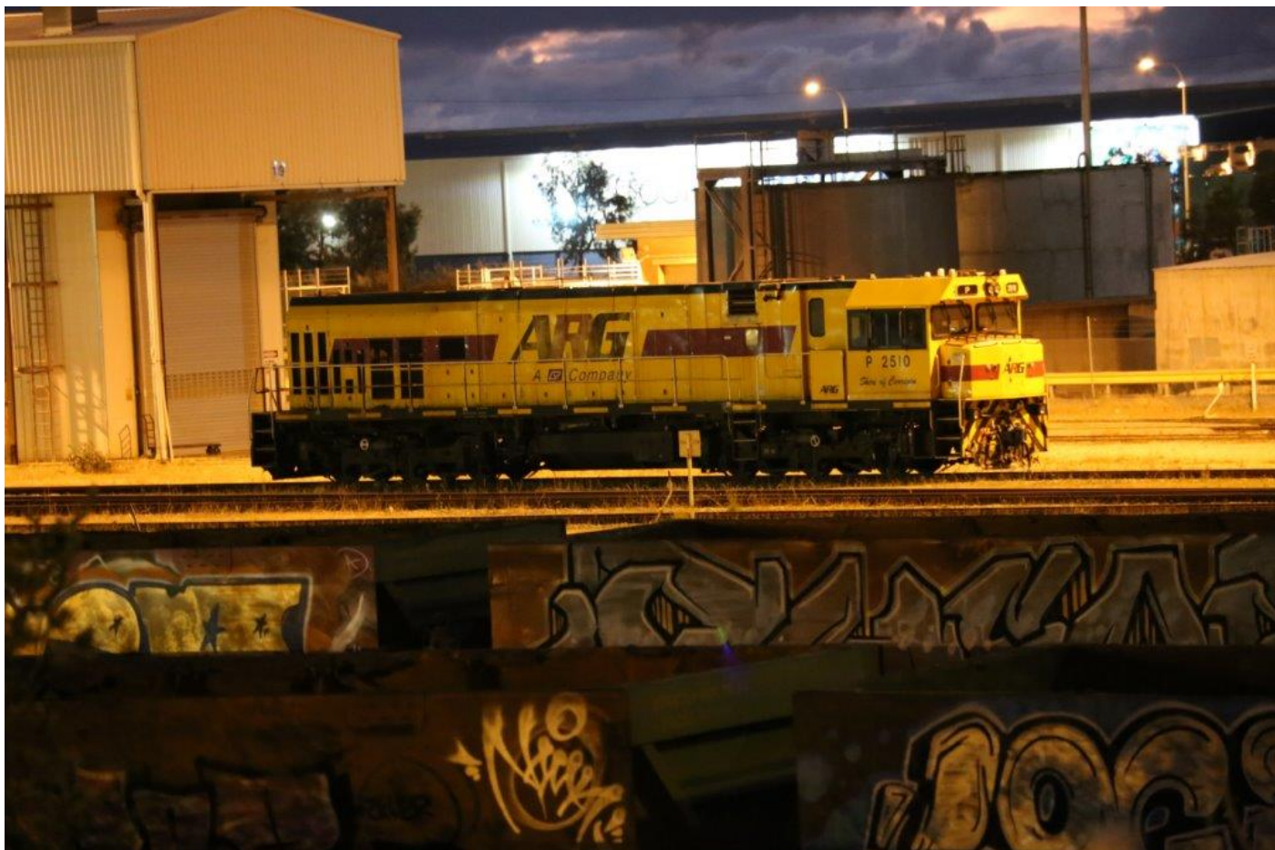
P2510 at Forrestfield at sunset, 13 th October.