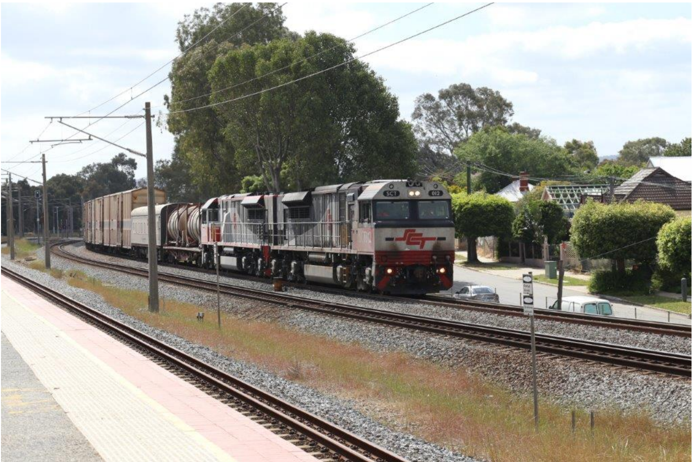
SCTs 012 & 003 lead a late-running 5MP9 through Woodbridge, 20 th October.