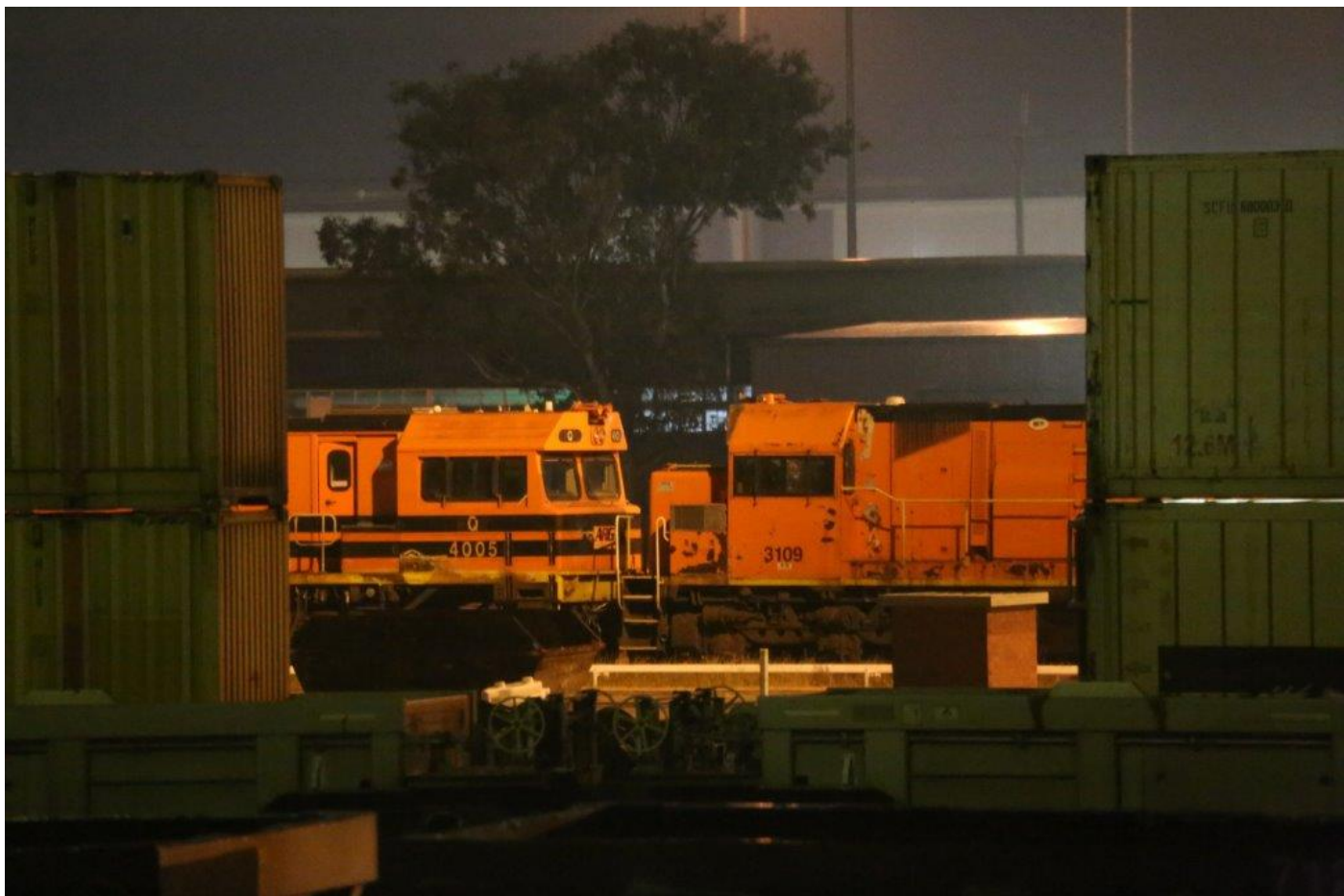
Stored Q4005 & LZ3109, Forreestfield, 13 th October.