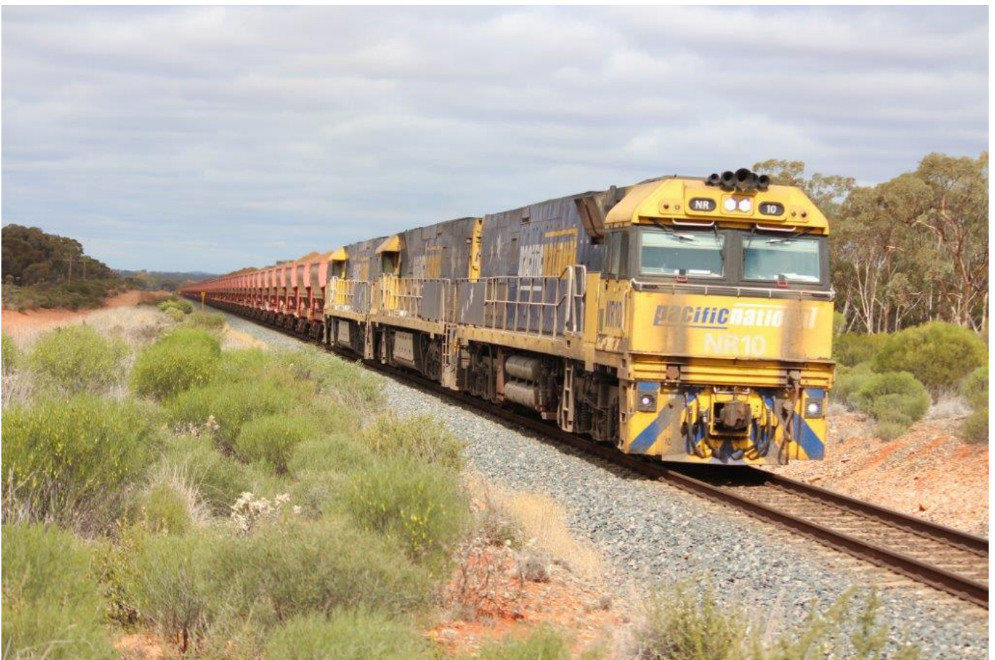
NRs 10, 59 & 111 approach Binduli with 7035 from Koolyanobbing, 5 th October.