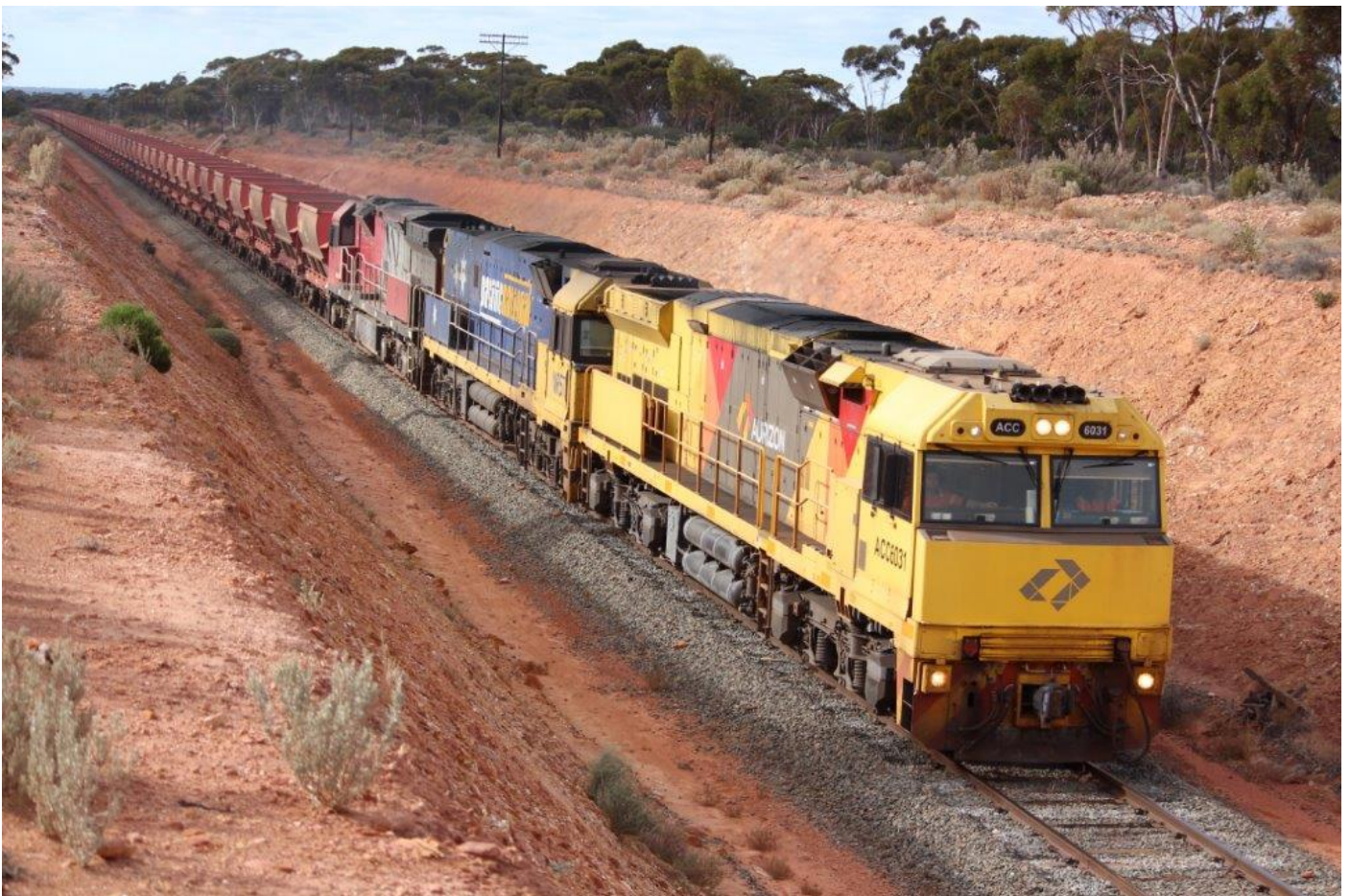
Leased ACC6031 leads NR57 & MRL004 on 6036 approaching Binduli, 5 th October.