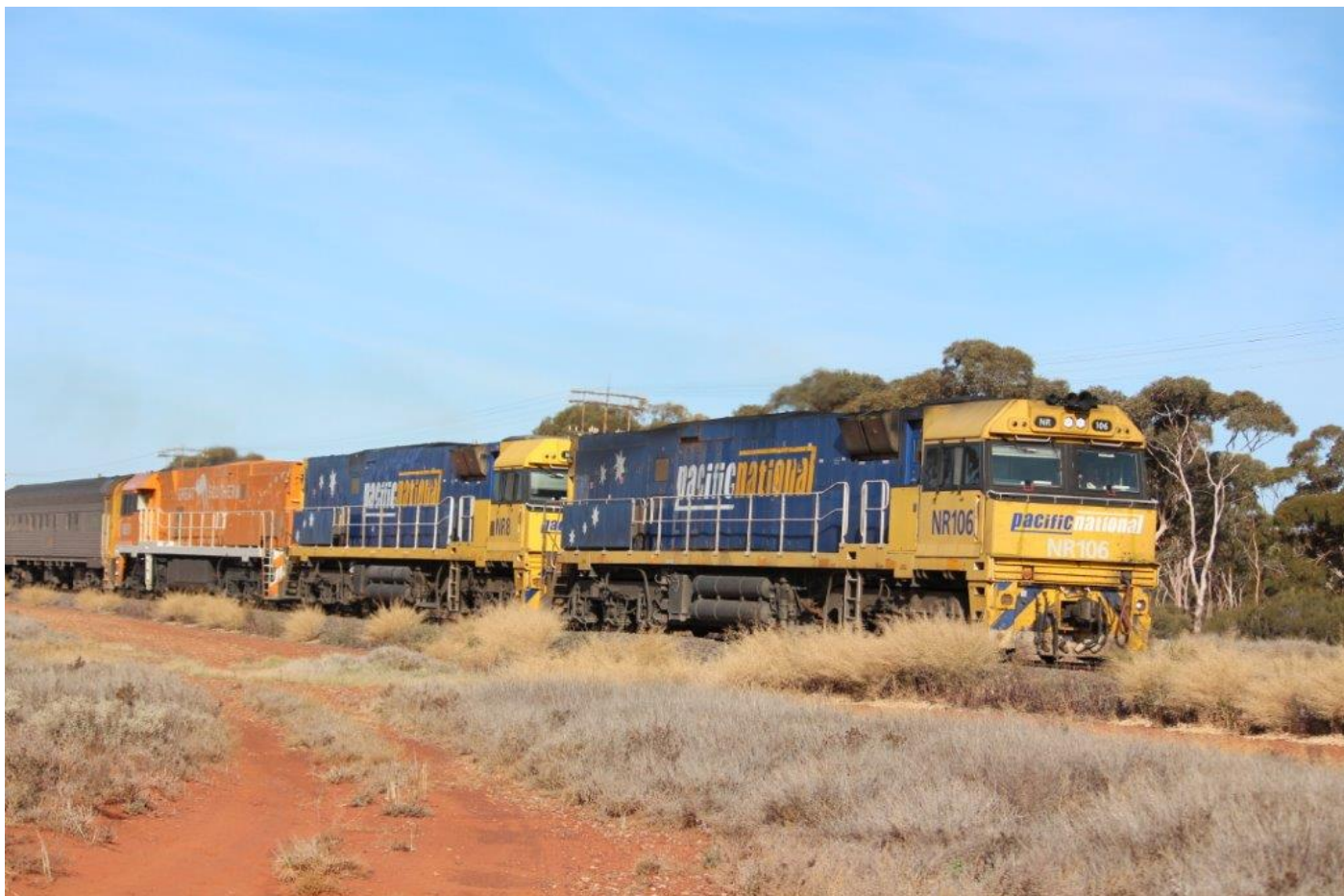
NRs 106, 8 & 31 depart Parkeston with 4MP5, 18 th October.