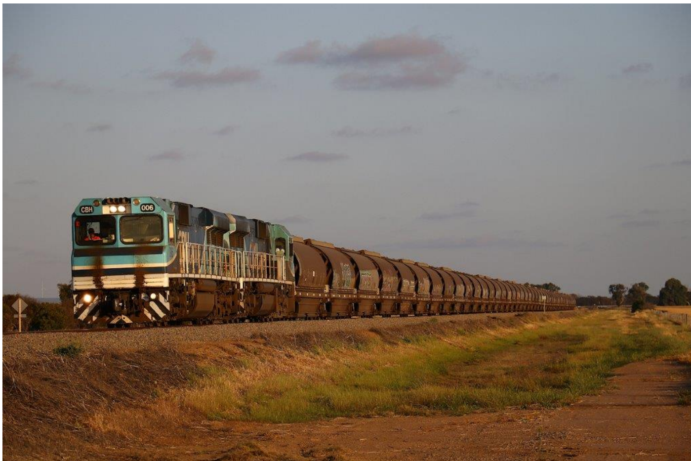
Close to sunset, CBH006 & 011 haul 5G51 through Bootenal, 10 th October.