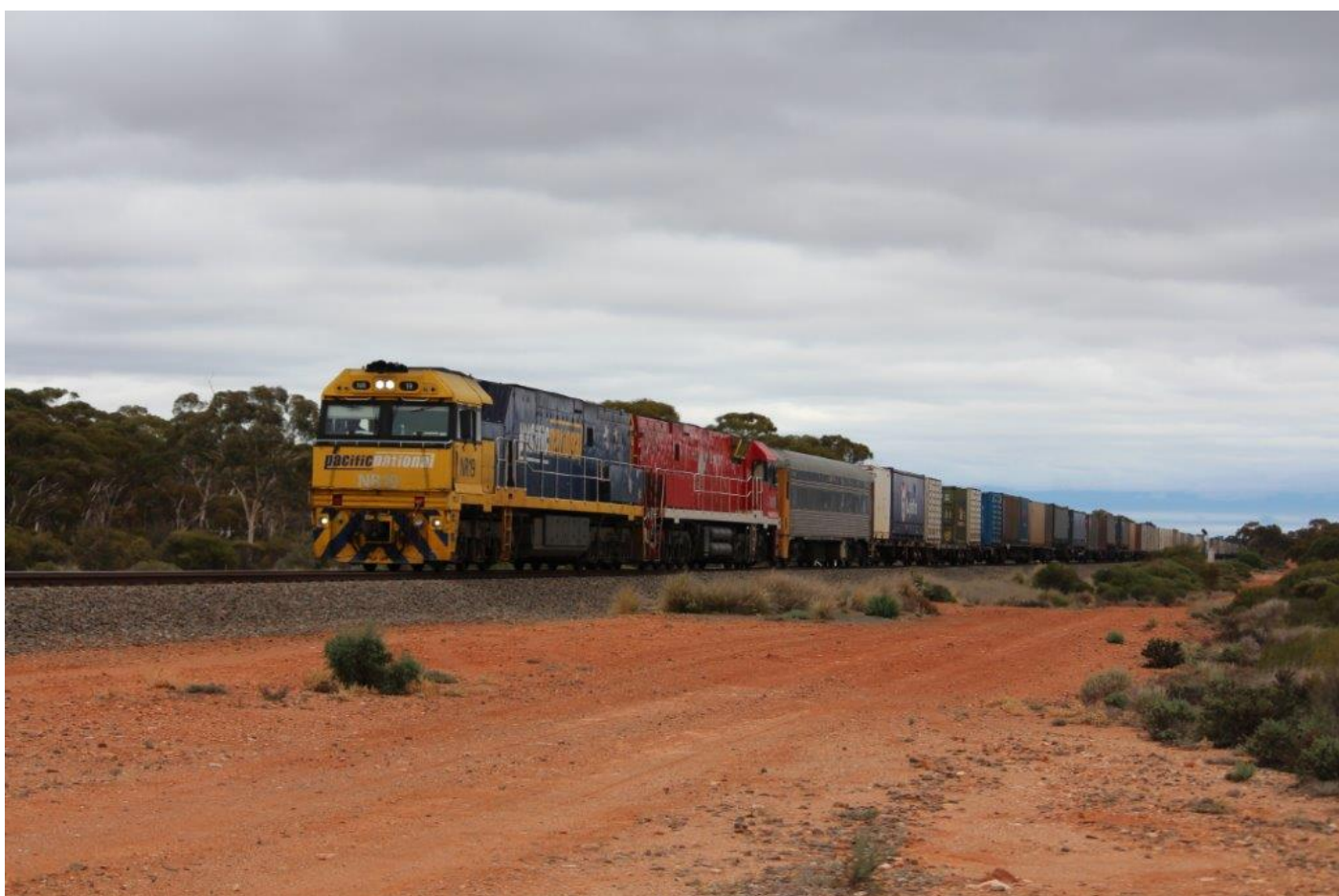
6PM7 races through Binduli behind NRs 19 & 18, 12 th October.