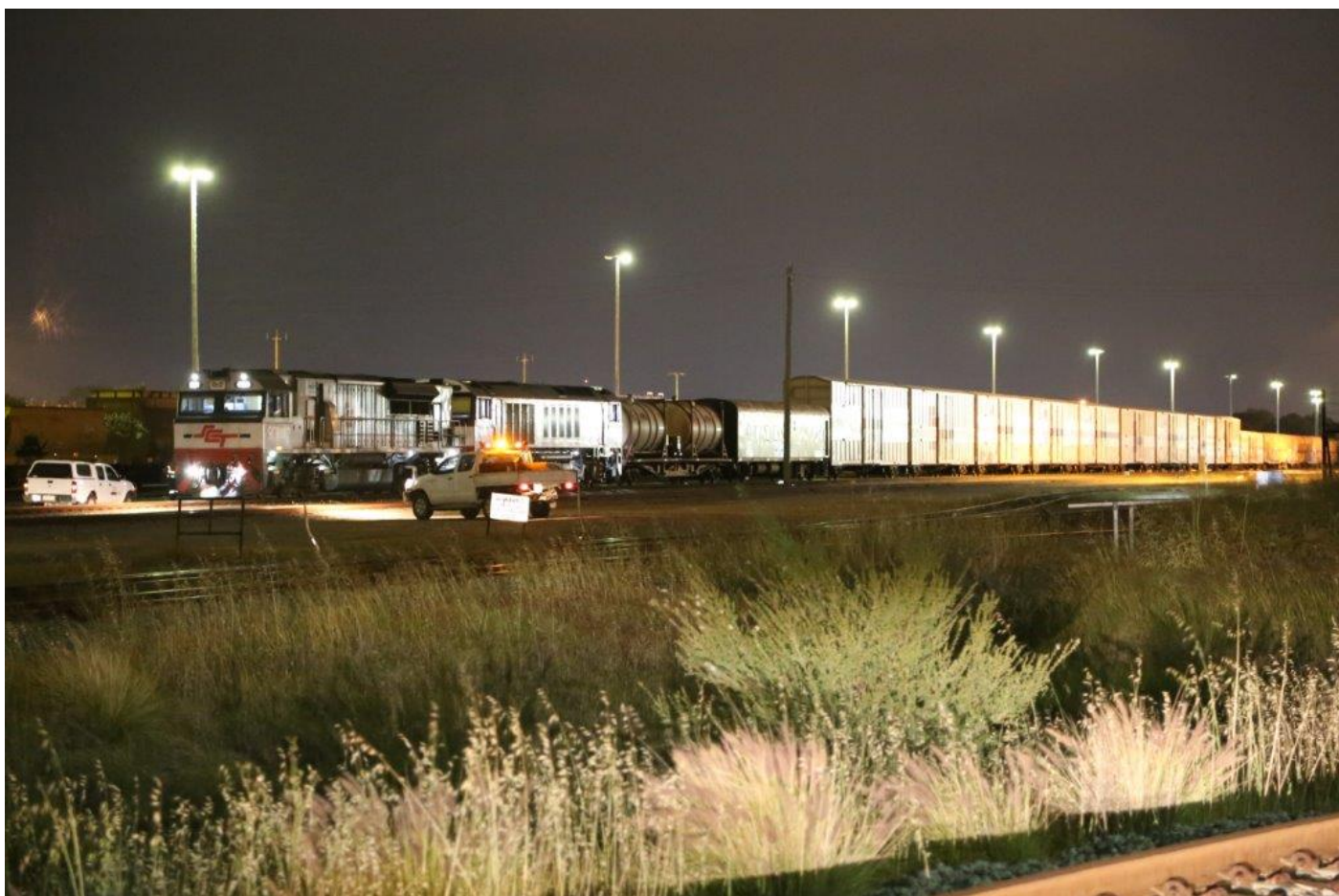
SCT005 & CSR002 on 1PM9 preparing for departure, Forreestfield, 13 th October.