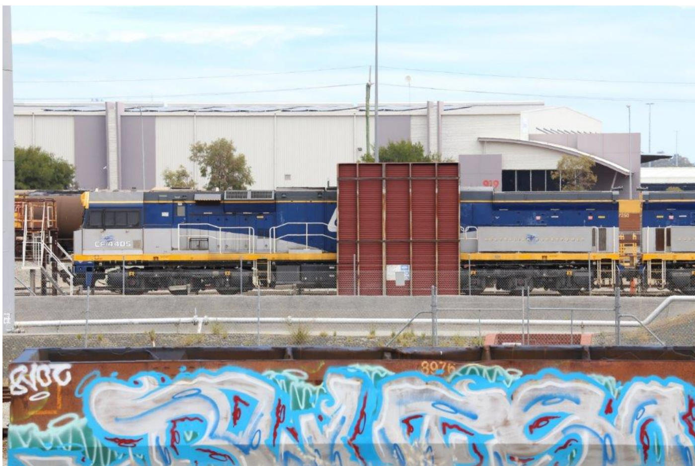
CFs 4405 & 4406 stored at Forrestfield, 3 rd November.