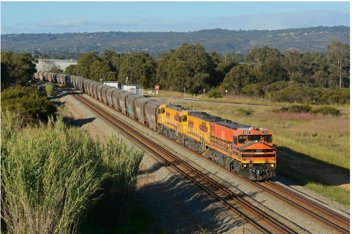
DBZs 2302, 2301 & 2305 ease 2K06 grain through Kenwick, 14 th October.