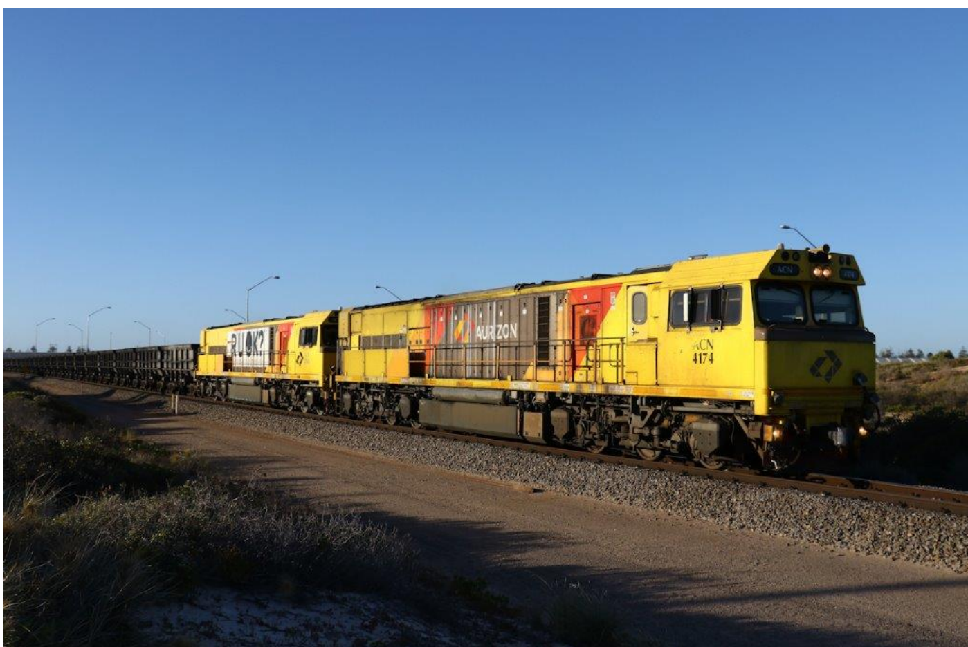
3764 empty Karara ore powered by ACNs 4174 & 4143 (4149 on rear) at Beachlands, 5/11.