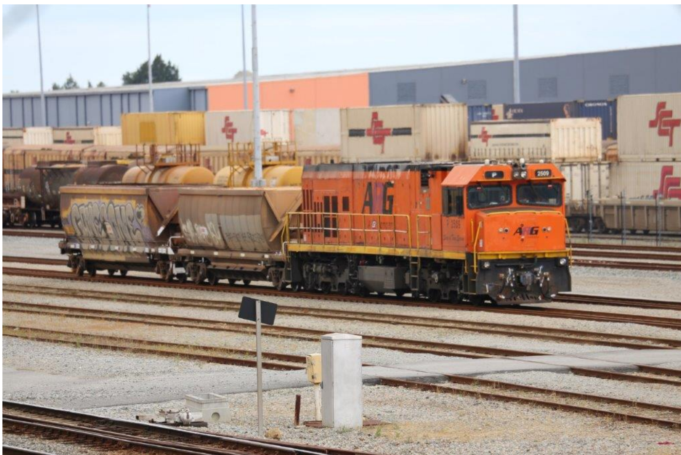
P2509 Shire of Three Springs has arrived from Hamilton on 1572 for workshops attention, 3 rd November.