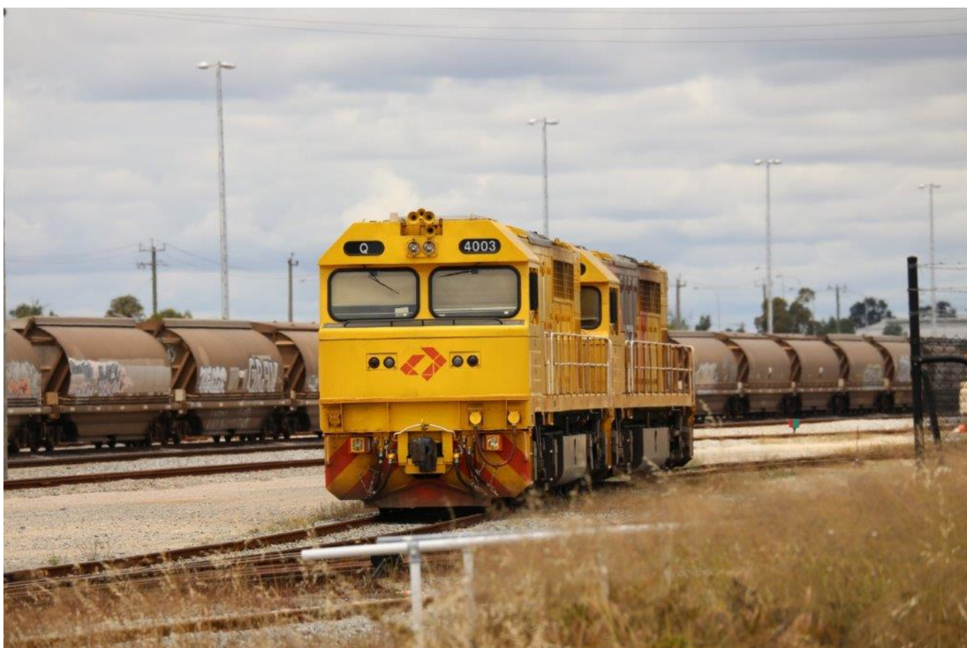
Q4003 and a sister unit await their next working at Forrestfield, 3 rd November.