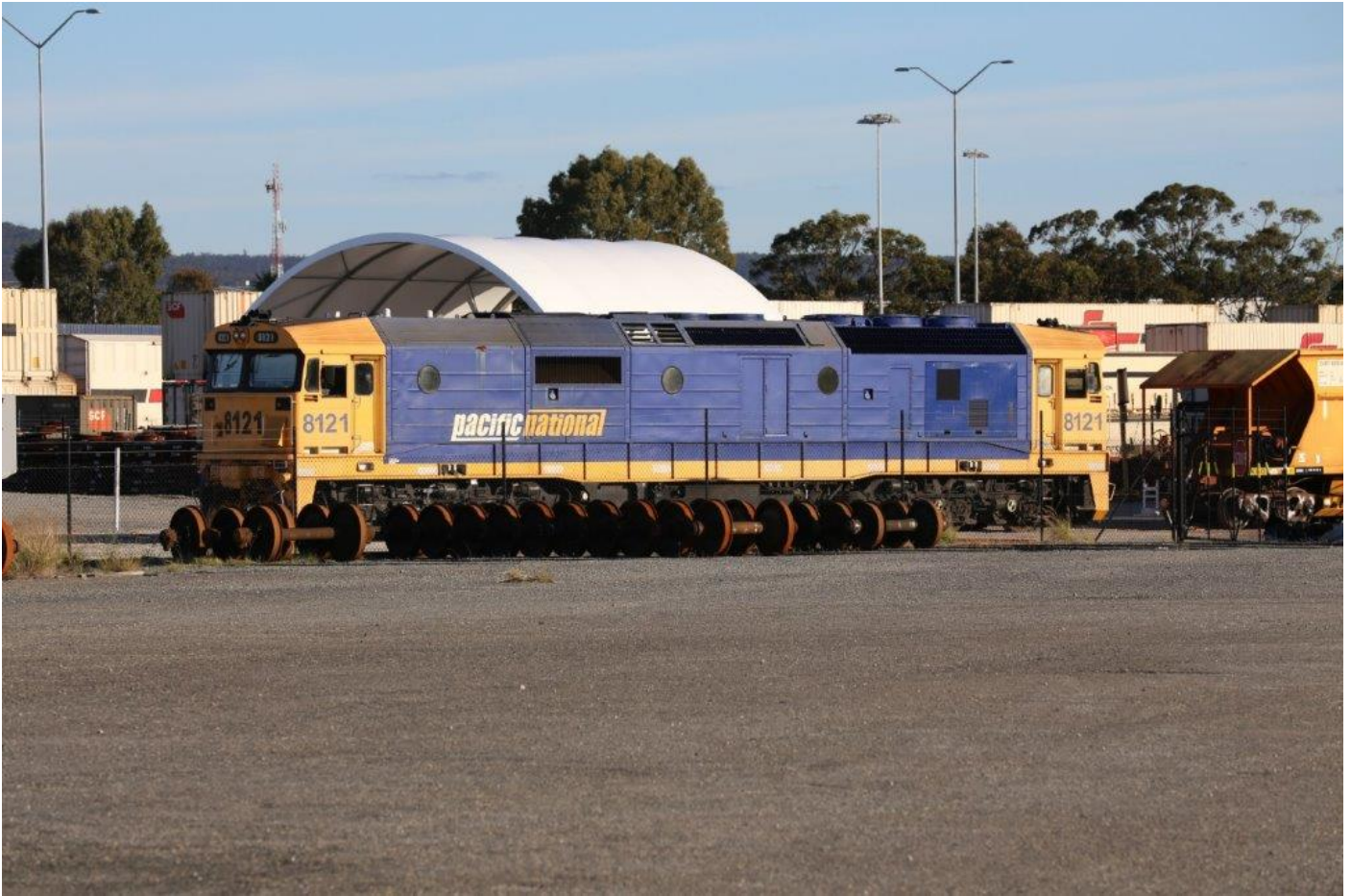
PN shunter 8121 stands at Forrestfield, 3 rd November.