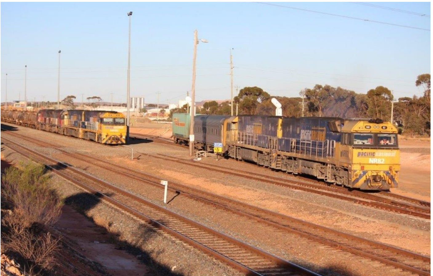
NRs 82 & 44 shunt 7MP5; NRs 85 & 40 lead MRLs 003 & 001 on 445 empty fuel to Esperance, West Kalgoorlie, 4 th November.