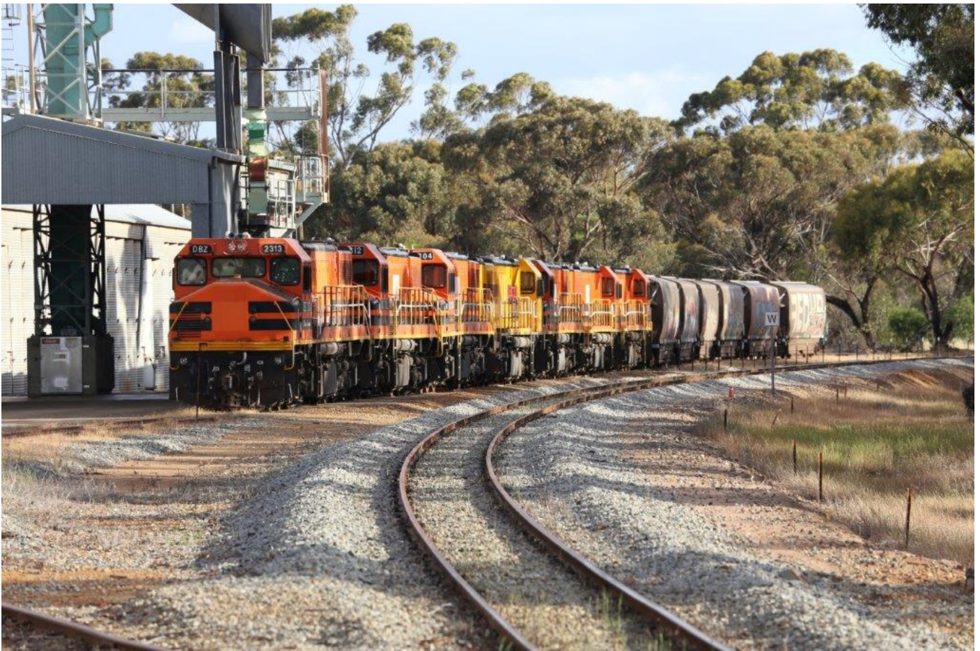
Stored DBZs at Beverley siding, 2 nd November.