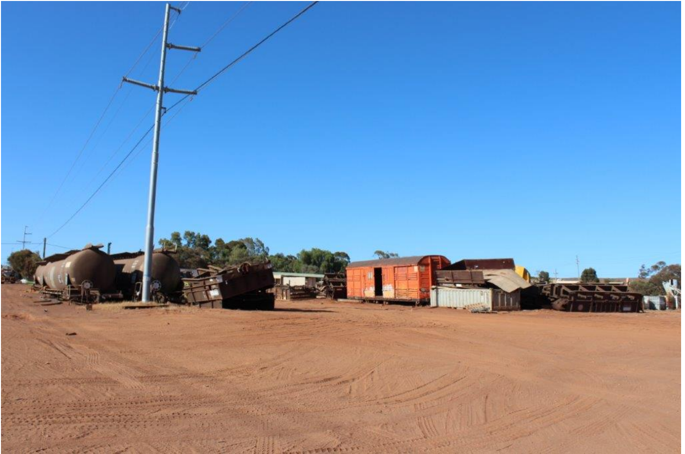
The van and three tank wagons continue to elude the scrapper’s torch, Boulder, 9 th November.