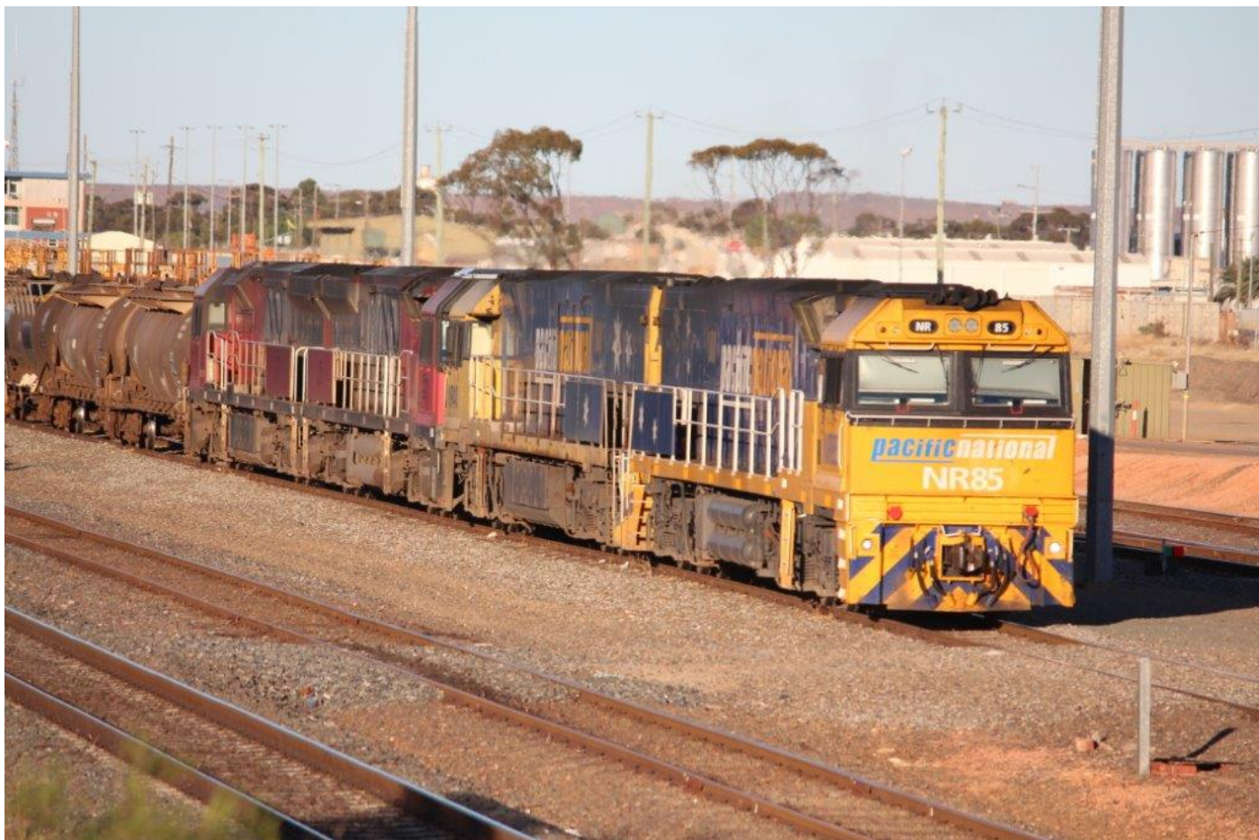
NRs 85 & 40 haul MRLs 003 & 001 on 445 empty fuel, West Kal, 4 th November.