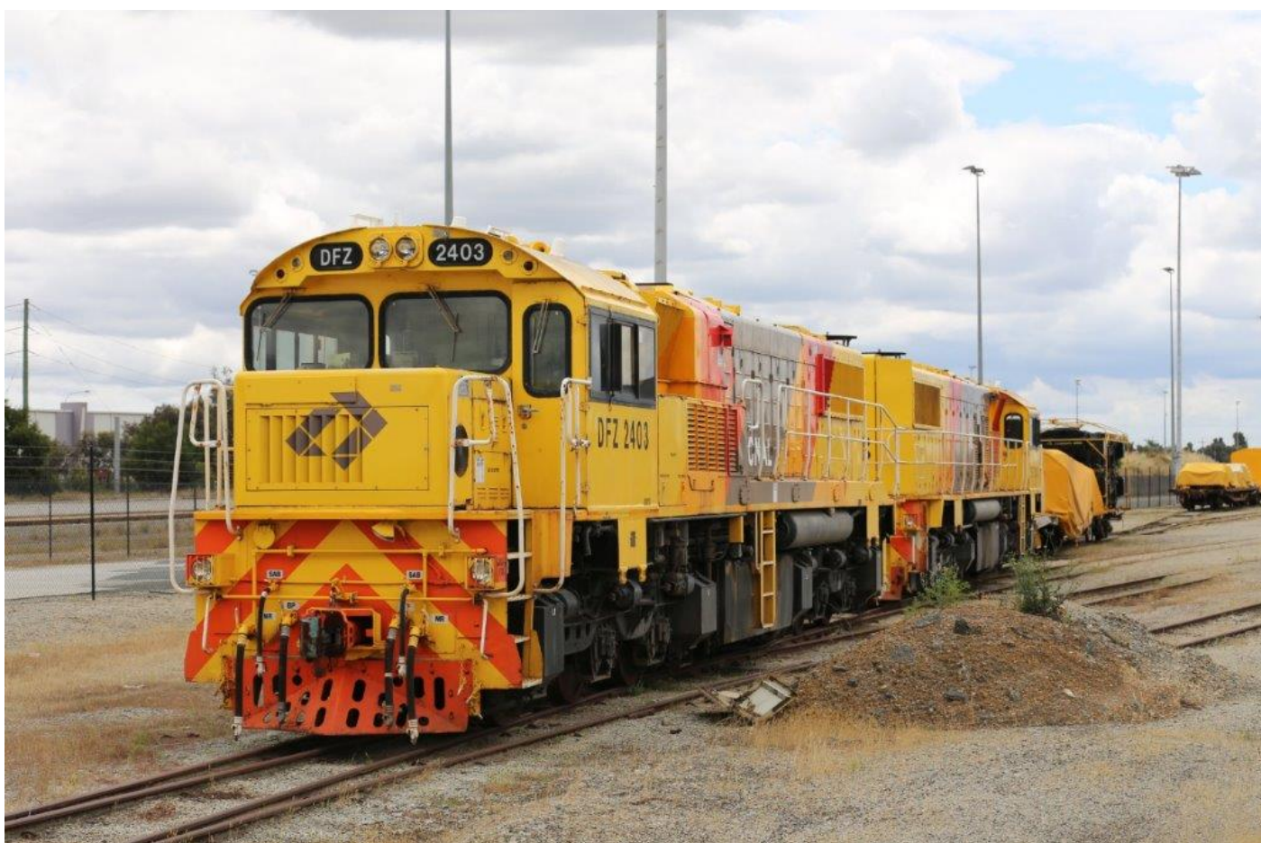
DFZ2403 and a sister unit stored at Forrestfield, 3 rd November.