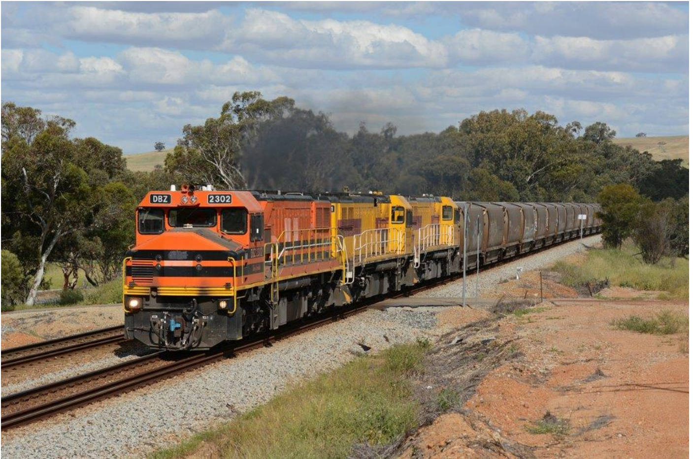
2K06 grain ex Brookton passes through York behind DBZs 2302, 2301 & 2305, 14 th October.