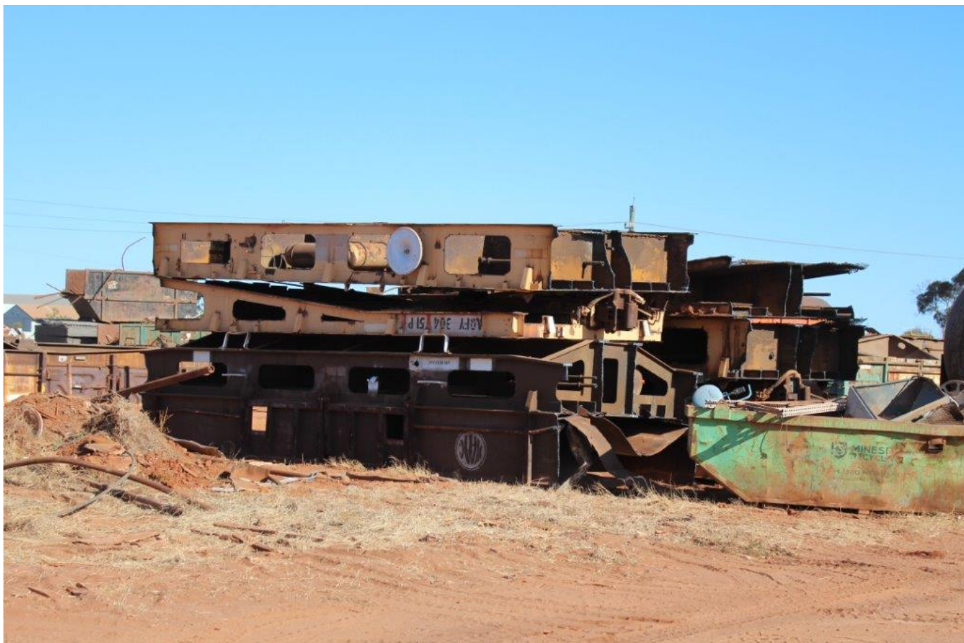
Sections of scrapped wagons, Boulder, 9 th November.