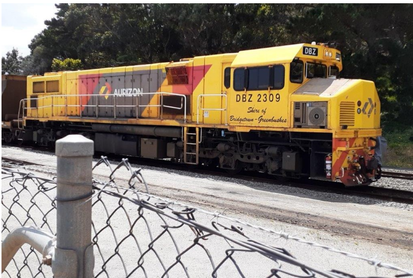
DBZ2309 Shire of Bridgetown-Greenbushes at Albany, 18 th October.