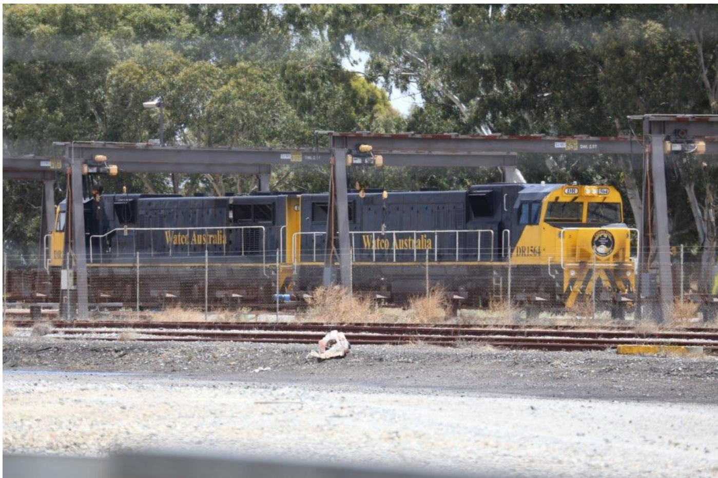
DRs 1564 & 1565 stabled in the Flashbutt compound, 2 nd November.