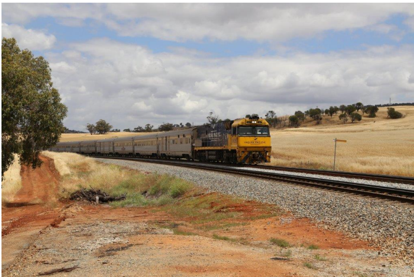
NR26 leads 5AP8 Indian Pacific through the Avon Valley, 2 nd November.