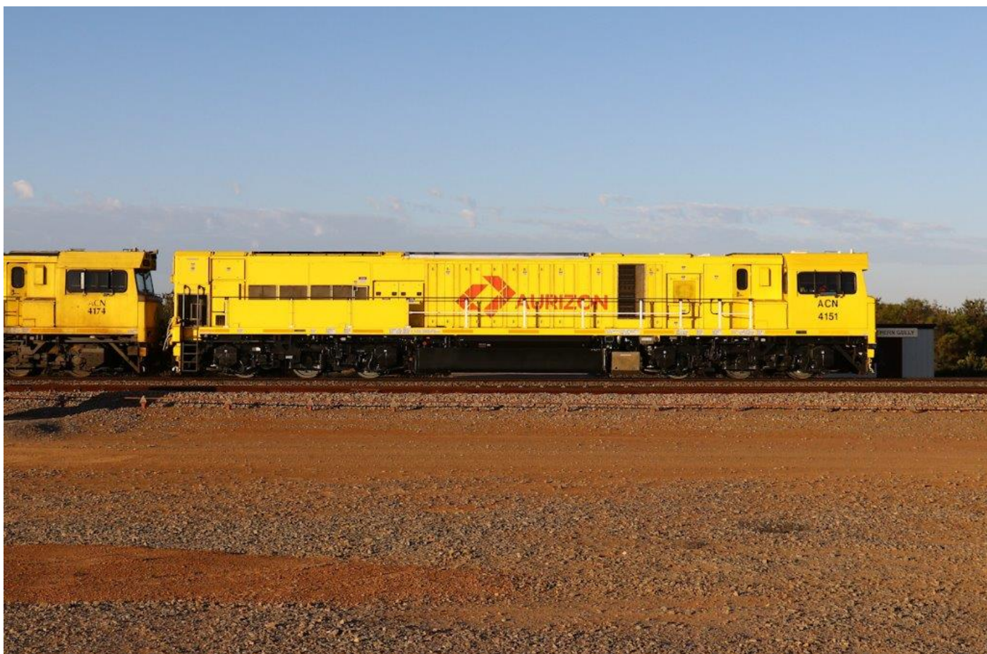
Freshly overhauled and repainted ACN4151 leads ACN4174 on 1764 ore, Northern Gully, 10/11.