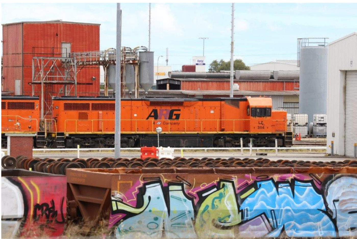
Stored LZ3114, Forreestfield, 3 rd November.