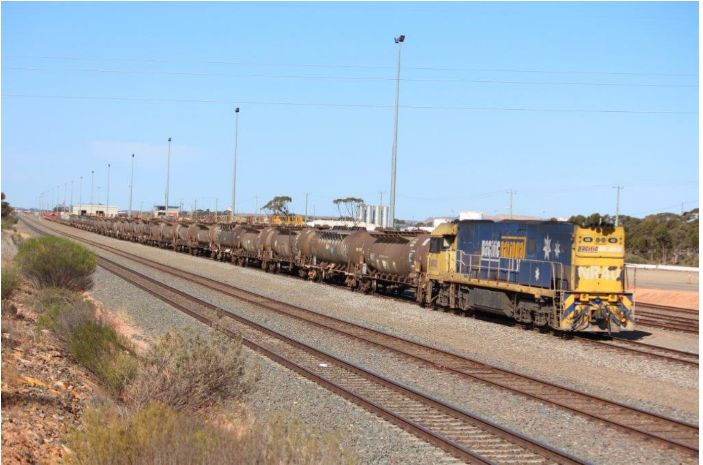
With NR85 sent to rescue failed 6MP5 on the desert, NR40 was left to run 2446 empty fuel solo to Esperance, 11/11.