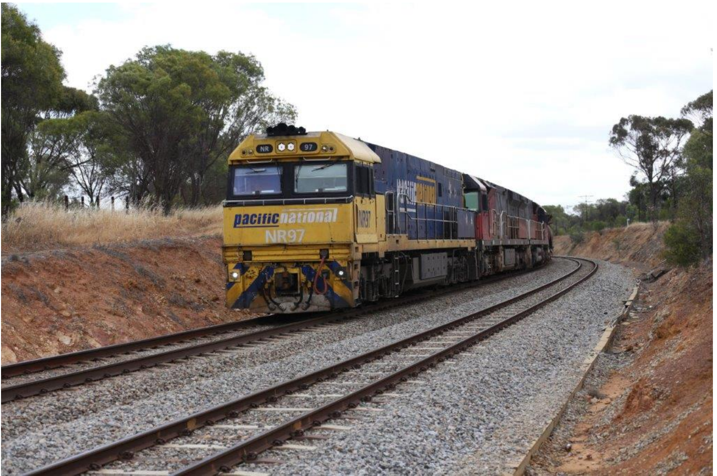
NR97, MRLs 001 & 003 approach Clarke St crossing, Northam, with 7PX4, 2 nd November.