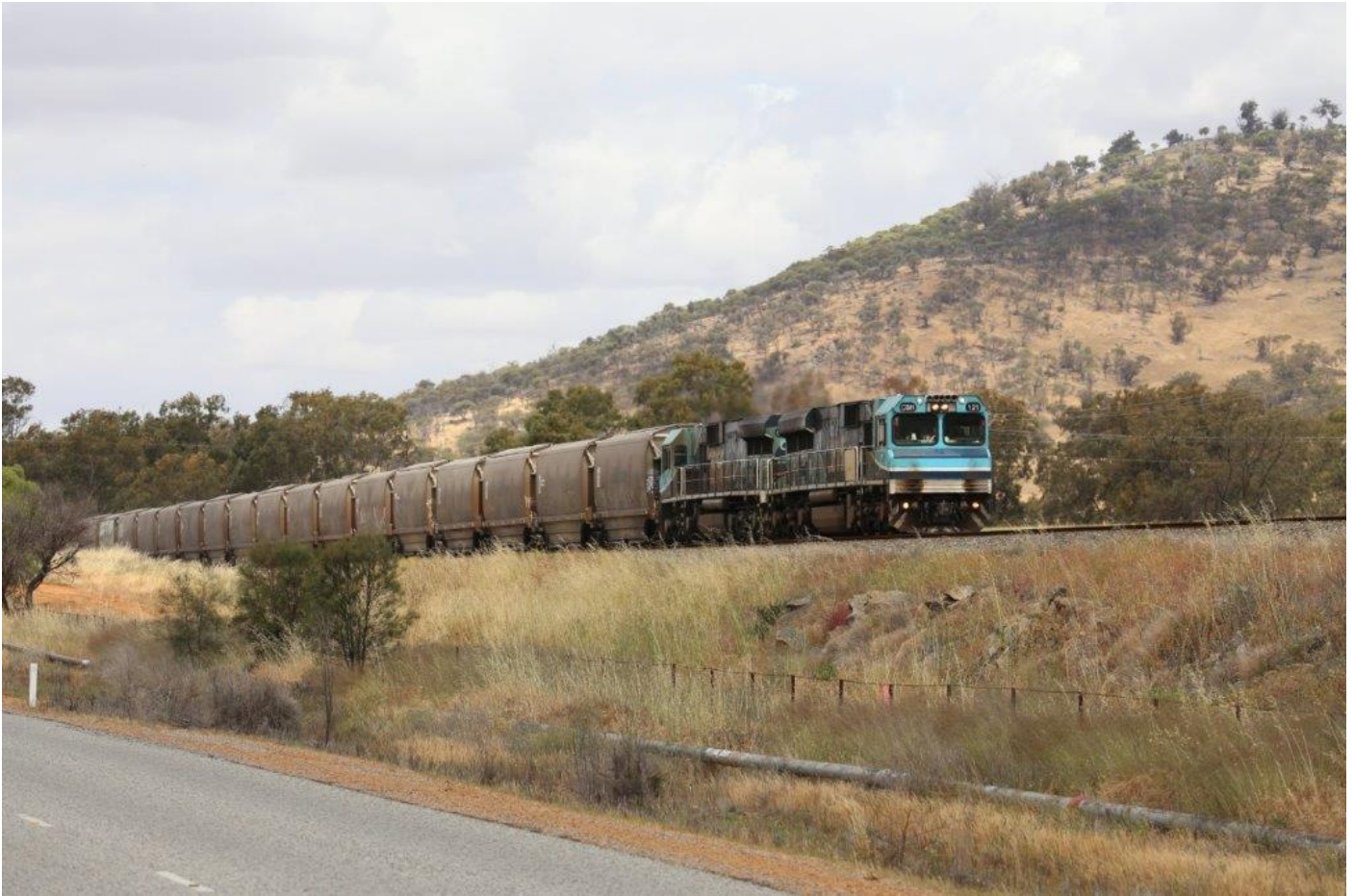
CBHs 121 & 120 parallel Toodyay-Northam Road in the Avon Valley, 2/11.