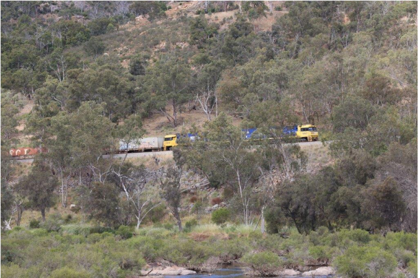
NRs 47 & 19 ease 6SP5 through Bells Rapids, 3 rd November.