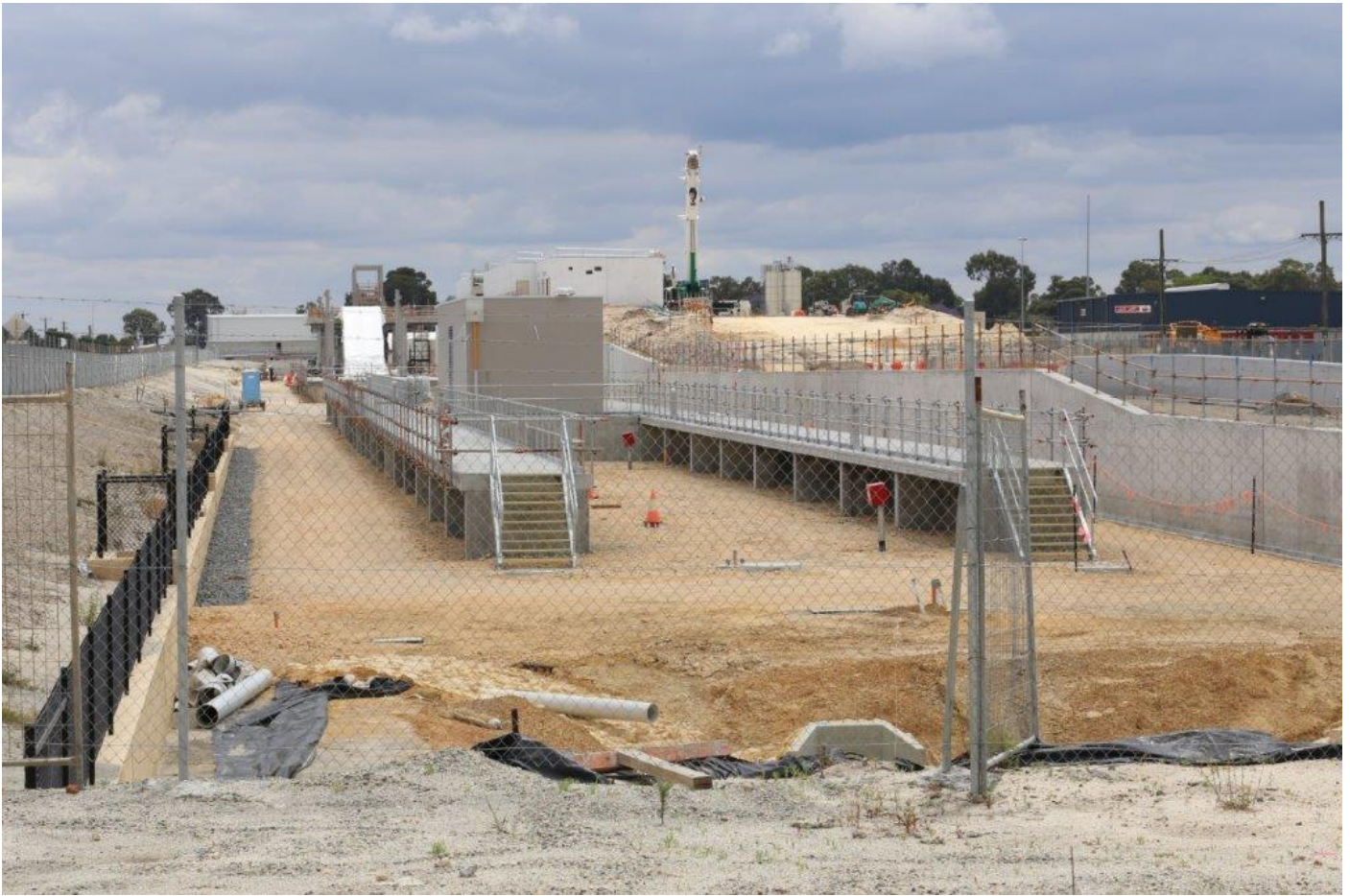
Construction of Forrestfield station is well advanced, 3 rd November.