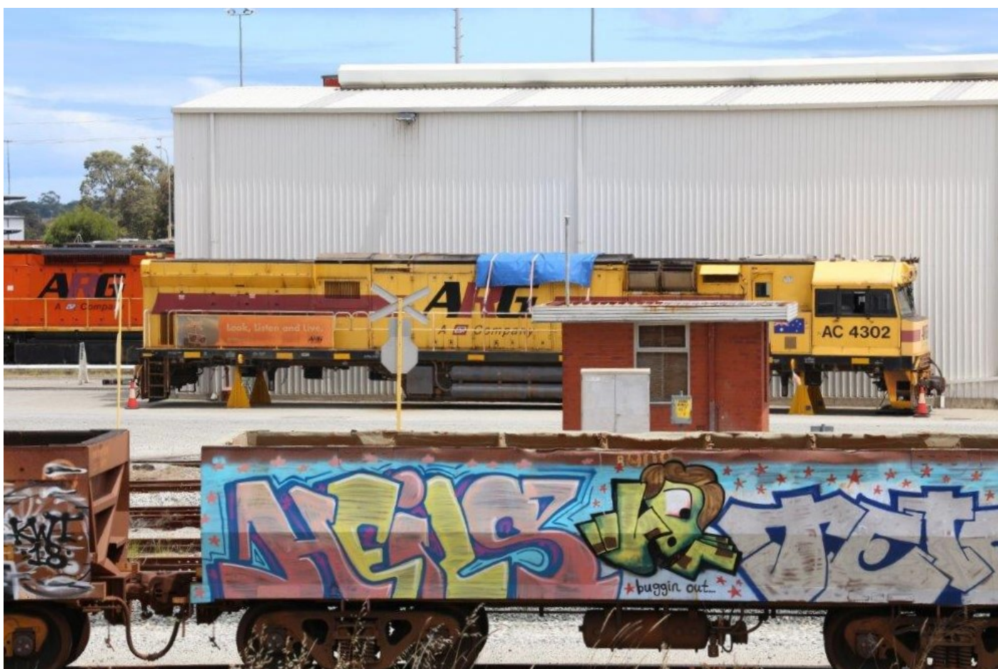
With most of its class now back in service, AC4302 remains on stands at Forrestfield, 3 rd November.