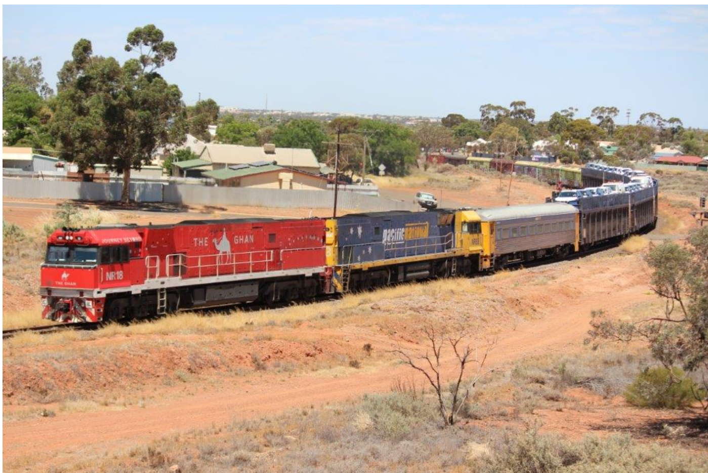
NRs 18 & 83 ease a late 7PM5 away from Kalgoorlie, 10 th November.