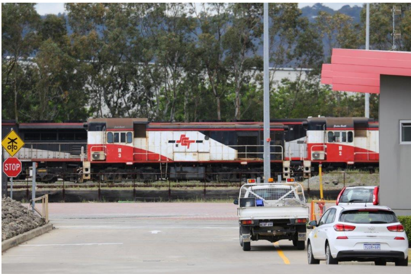
Stored shunters H2 & H3 beside a pair of SCTs, Forrestfield, 3 rd November.