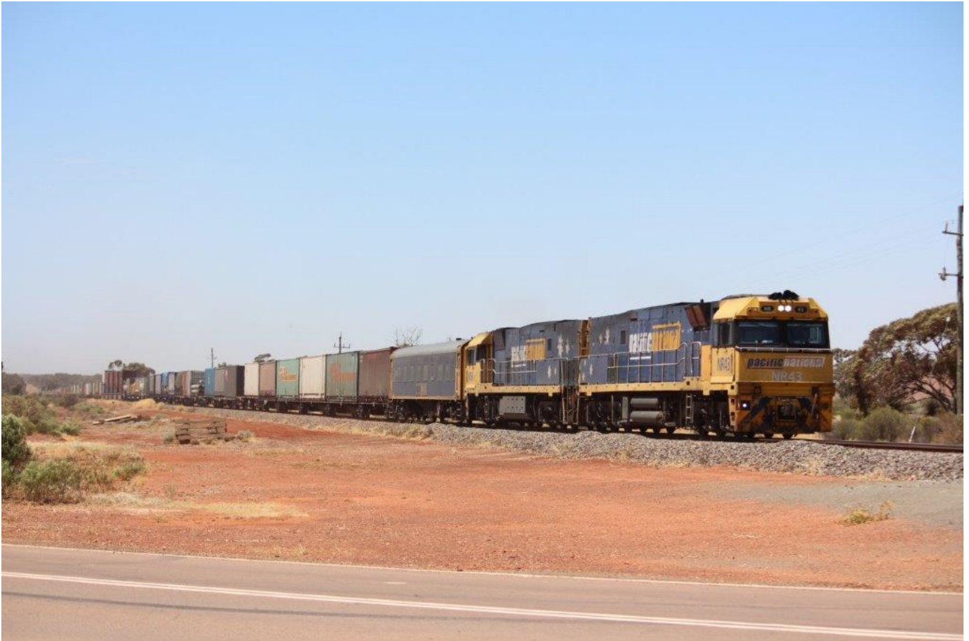
NRs 43 & 96 approach Parkeston with 6MP4, 10 th November.