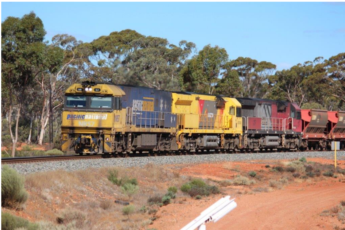
7030 empty Kooly ore departs Binduli behind NR57, ACC6030 & MRL004, 2 nd November.