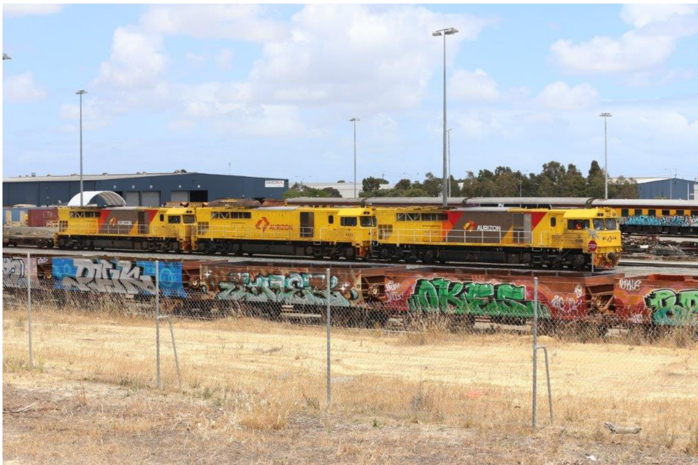
Above: Qs 4006, 4003 & 4011, 7157 fuel shunt ex Kwinana. Note the four stored Aurizon Intermodal crew coaches.