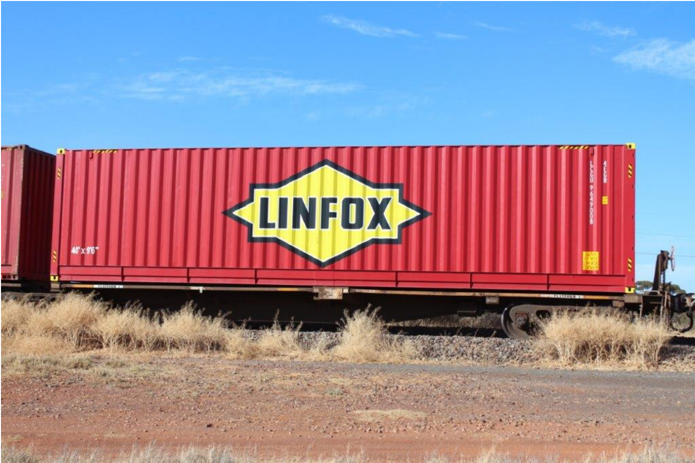
Linfox received several hundred new containers recently – a 40' LCGU on 6MP5, 11/11. Page 26 of 27