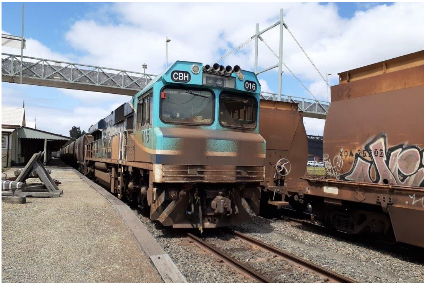
CBH016 has just been shut down on a stabled grain rake at Albany, 18 th October.