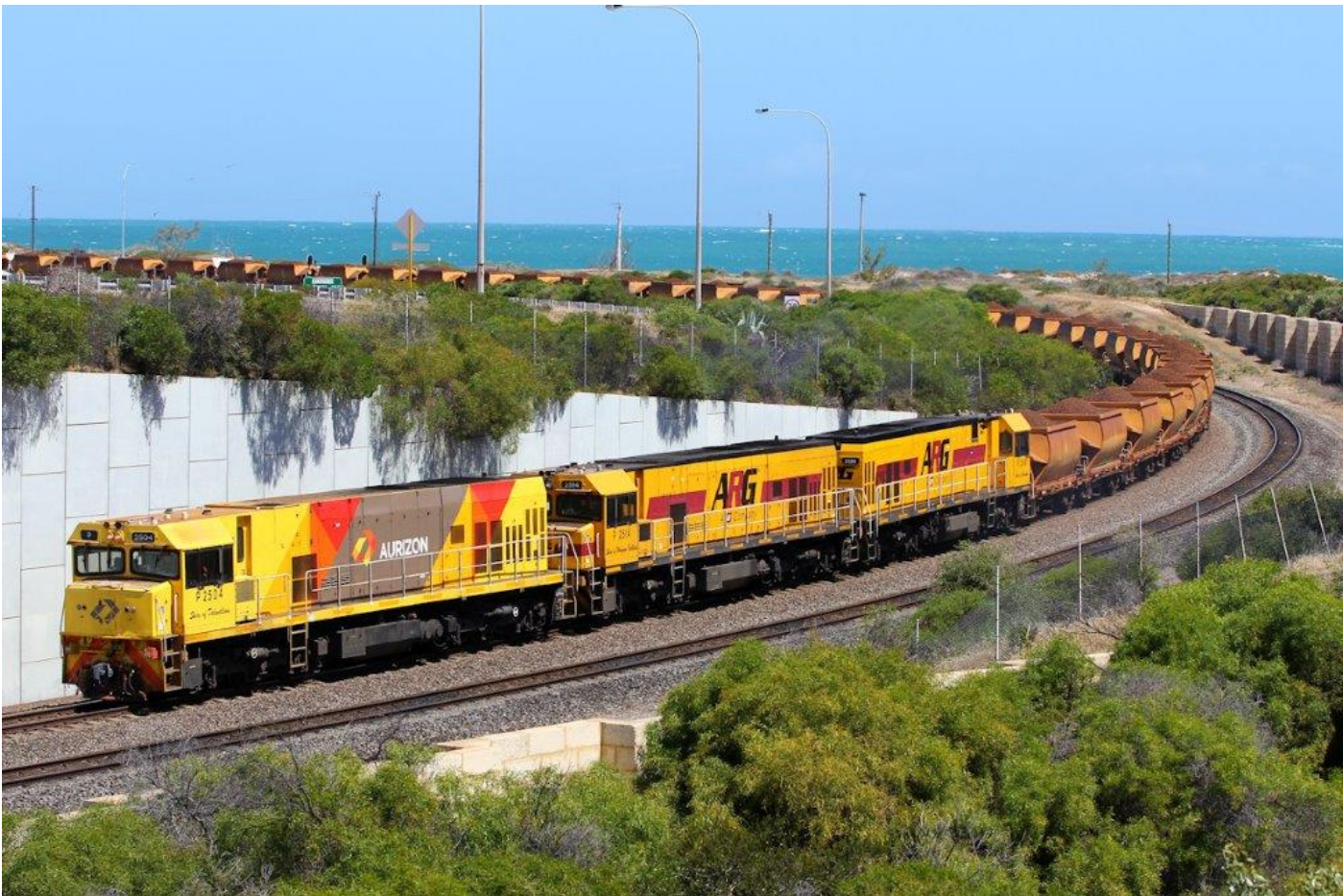
Ps 2504, 2514 & 2508 arrive at Geraldton Port with 7721 Mt Gibson ore, 2 nd November.