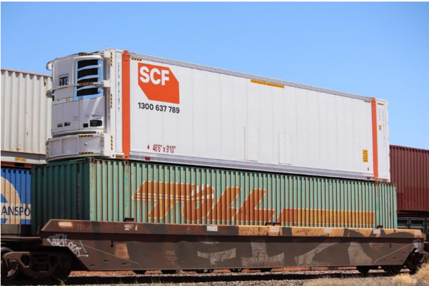
SCF have recently invested in many new containers, including around twenty 46'6' reefers.