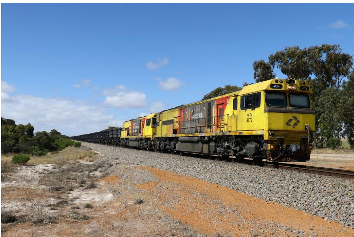
ACNs 4172 & 4170 (4144 on rear) with 7763 loaded Karara ore at Bringro East, 2 nd November.