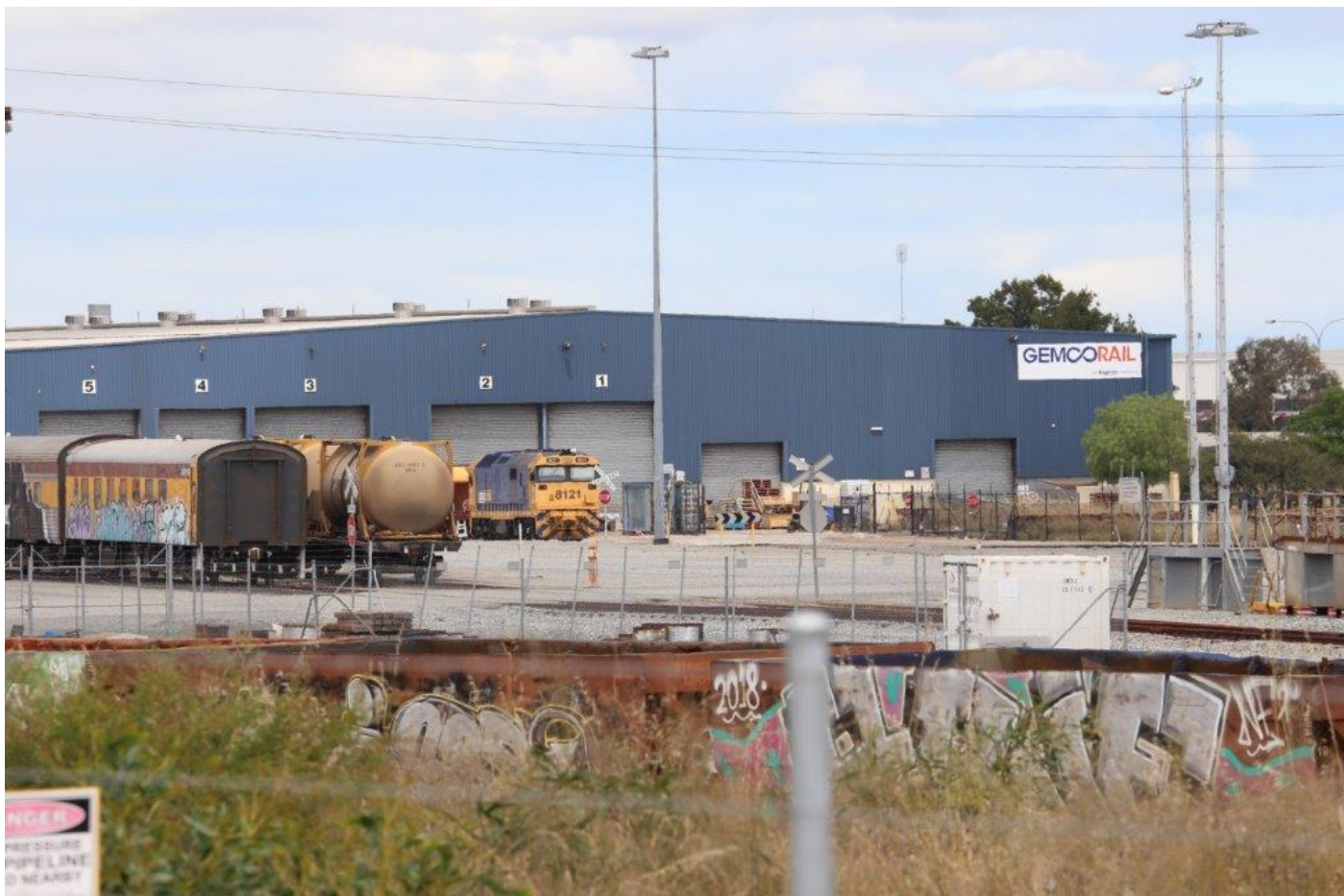
8121 at Gemco's shed, Forrestfield; Aurizon Intermodal's stored crew coaches and fuel pods stand nearby, 3/11.