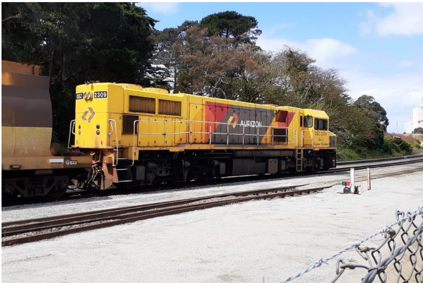
DBZ2309 on the woodchip rake at Albany, 18 th October.