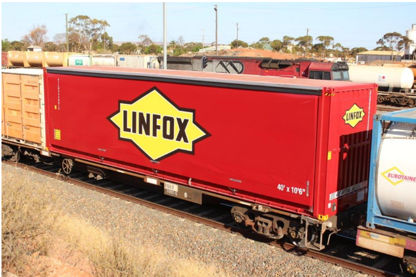
Linfox have also refurbished several former FCL curtainsiders recently – FTLU4320015 on 6MP5, 11 th November.