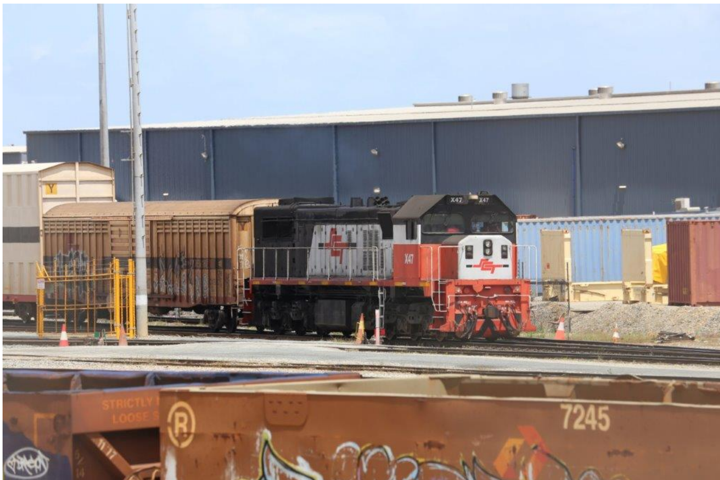
X47 starts to shunt SCT's terminal (above) while its exhaust smoke blankets the Aurizon fuel shunt (below), Forrestdfield, 2 nd November.