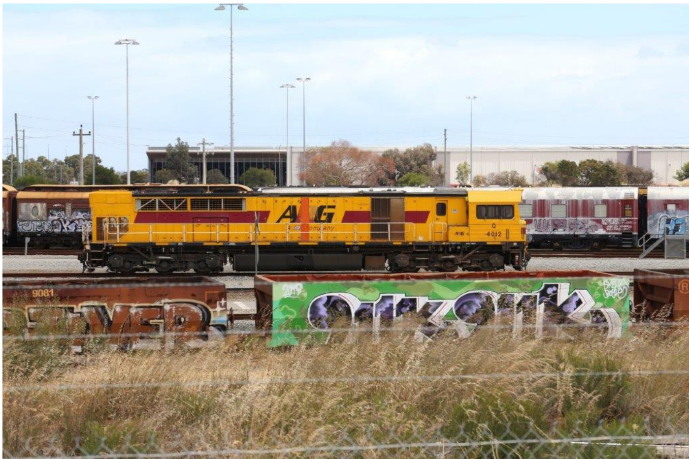
Stored Q4012 (above) and DFZs 2404 & 2406 (below) at Forrestfield, 2 nd November.