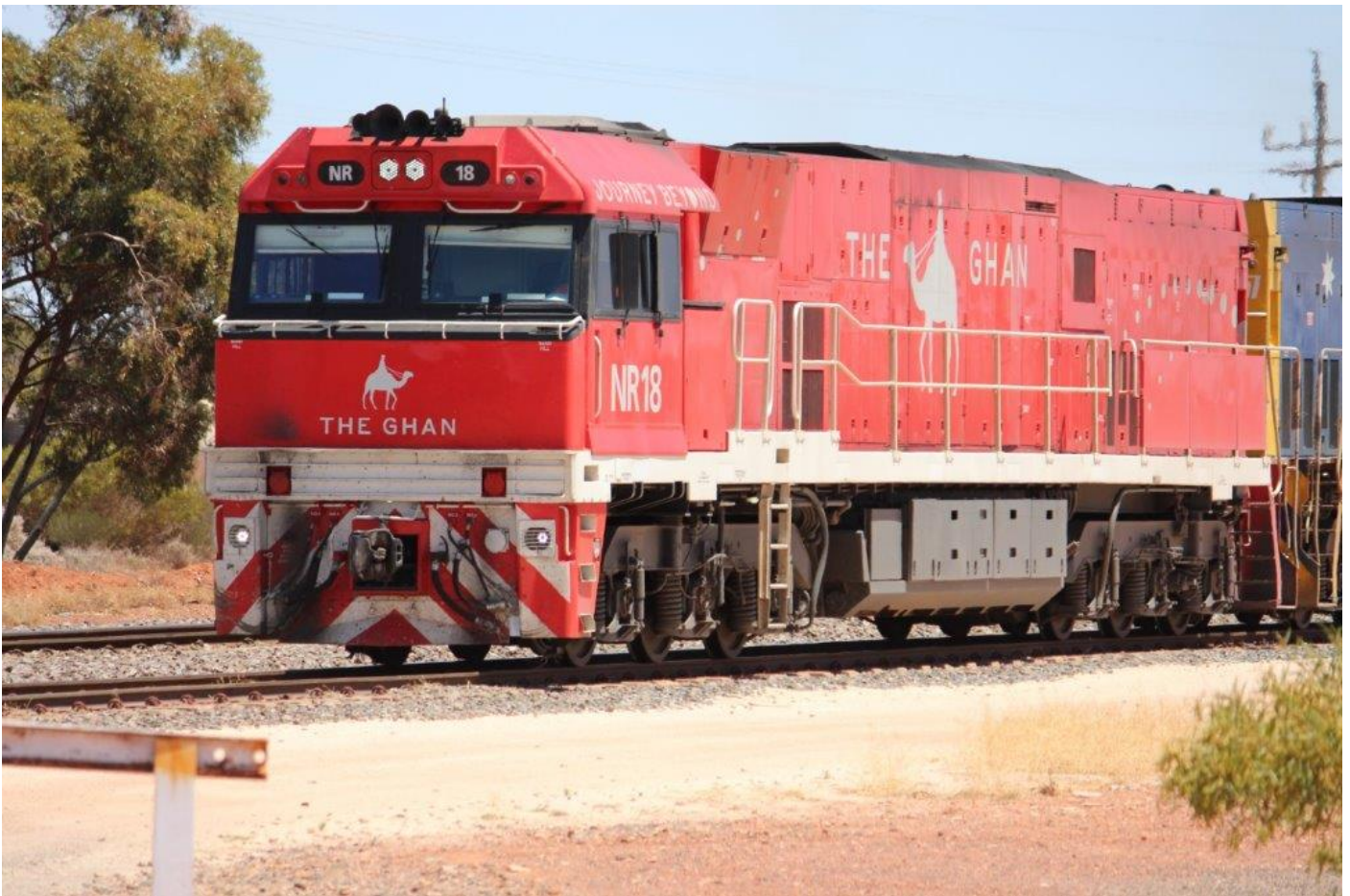
NR18 in Journey Beyond's latest Ghan scheme, Parkeston, 10 th November.