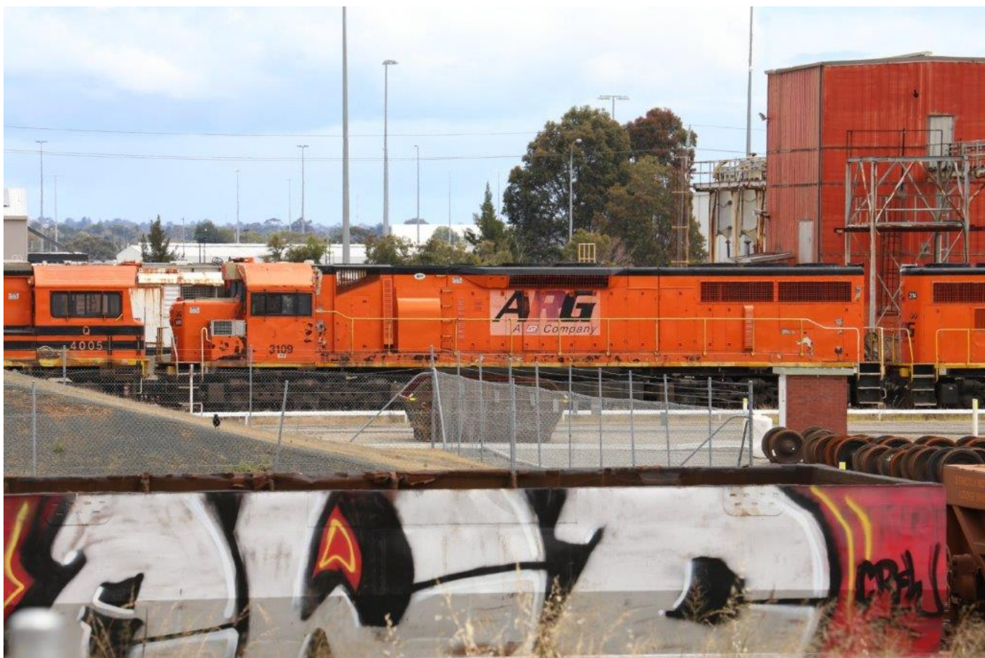
Q4005 & LZ3109 stored at Forreestfield, 3 rd November.