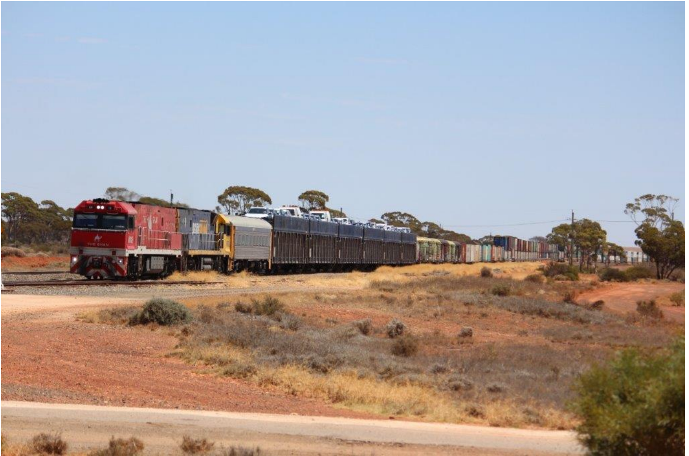
Over six hours late, 7PM5 arrives at Parkeston behind NRs 18 & 83, 10 th November.