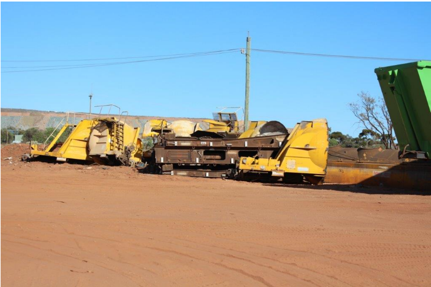
Parts of APNys and a flat wagon at the scrap yard, Boulder, 9 th November.