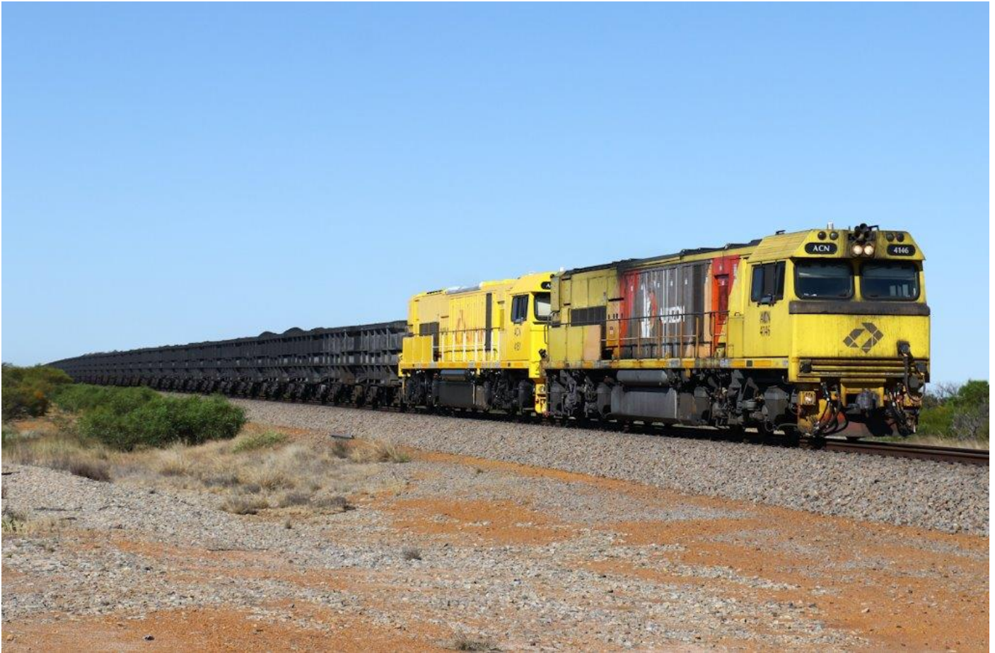
ACNs 4146 & 4151 (4171 on rear) with 2763 loaded Karara ore, Kojarena, 4 th November.