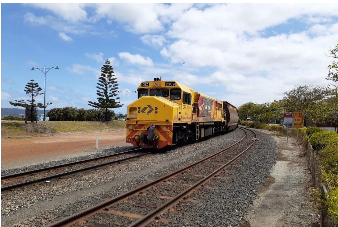
DBZ2309 stabled at Albany, 18 th October.