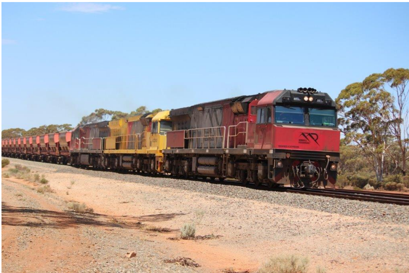
MRL001, ACC6030 & MRL003 depart Hampton with 1030 empty ore, 10 th November.