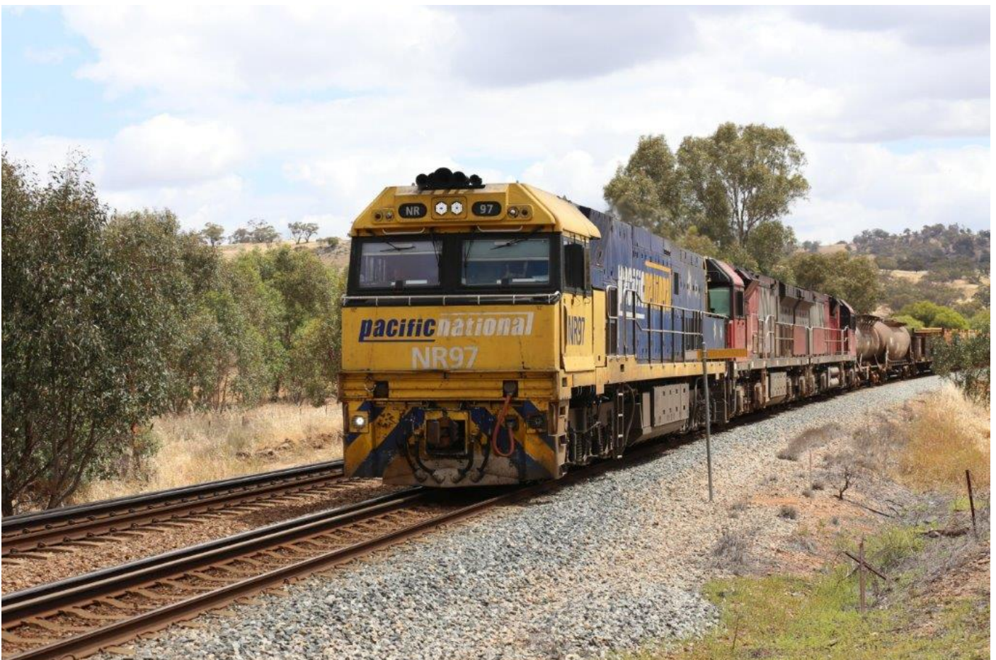
7PX4 at the Toodyay-Northam Rd crossing, NR97 leading MRLs 001 & 003 ex workshops to West Kal, 2 nd November.